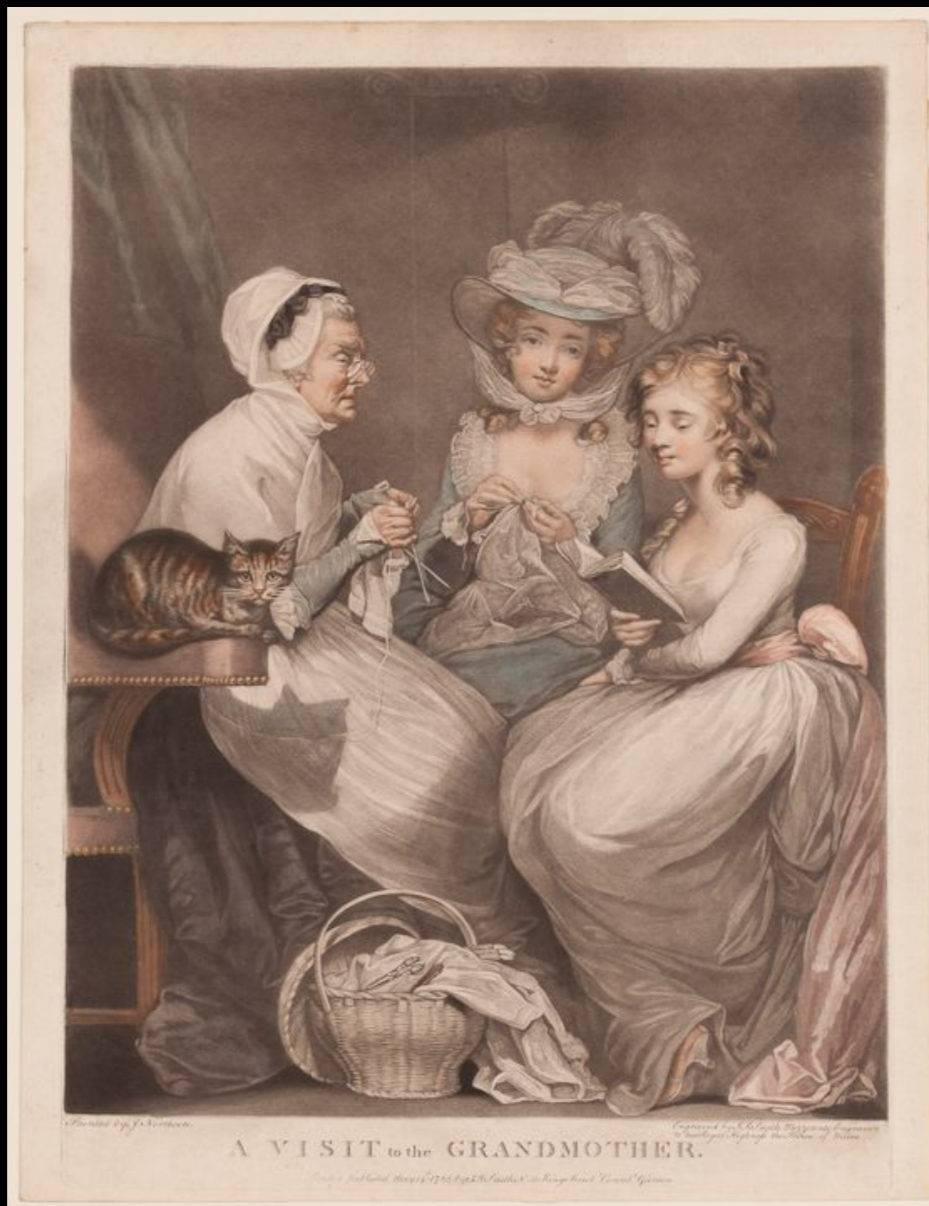
“A VISIT to the GRANDMOTHER.” by by John Raphael Smith, after Thomas James 1785