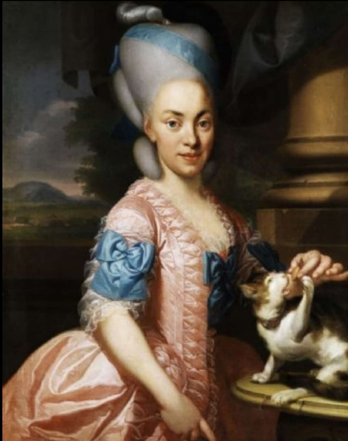
Portrait eines Nürnberger Edelfräuleins by Johann Eberhard Ihle