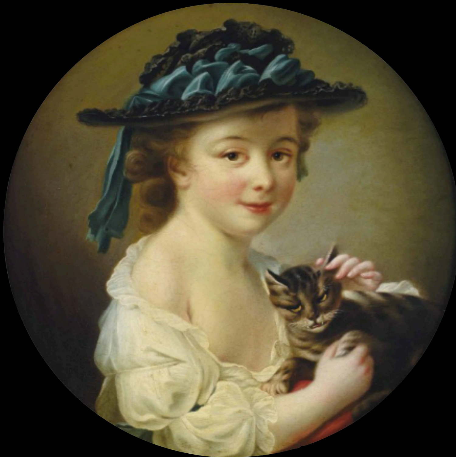
French Girl with a Cat by the Circle of Francois Drouais of Paris (1725 - 1775)