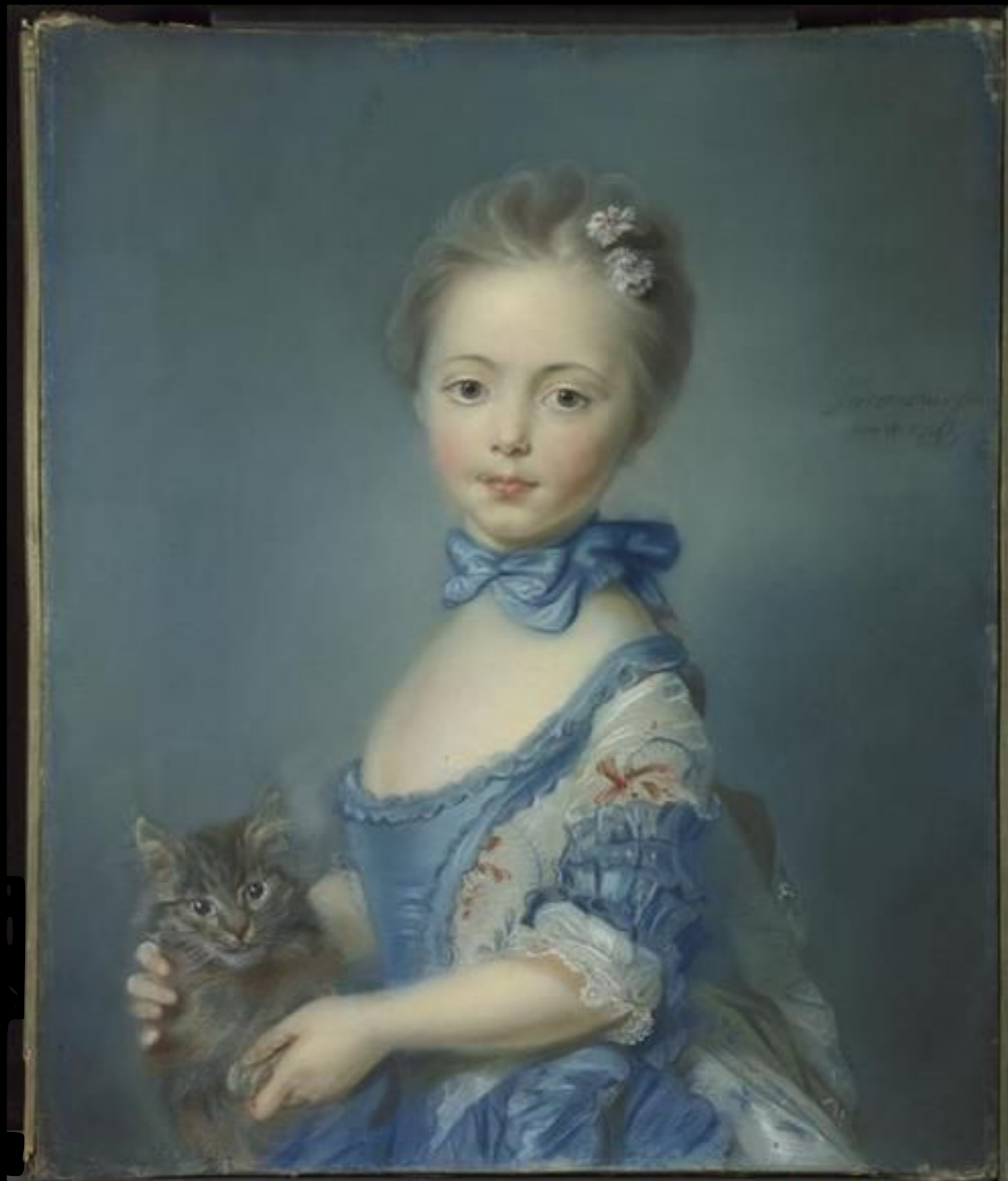
Fillette avec un chaton by Jean-Baptiste Perronneau 1747