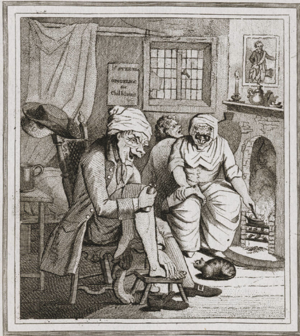
The COMPLIMENTS of the SEASON. Kibe Heels & Chilblains.