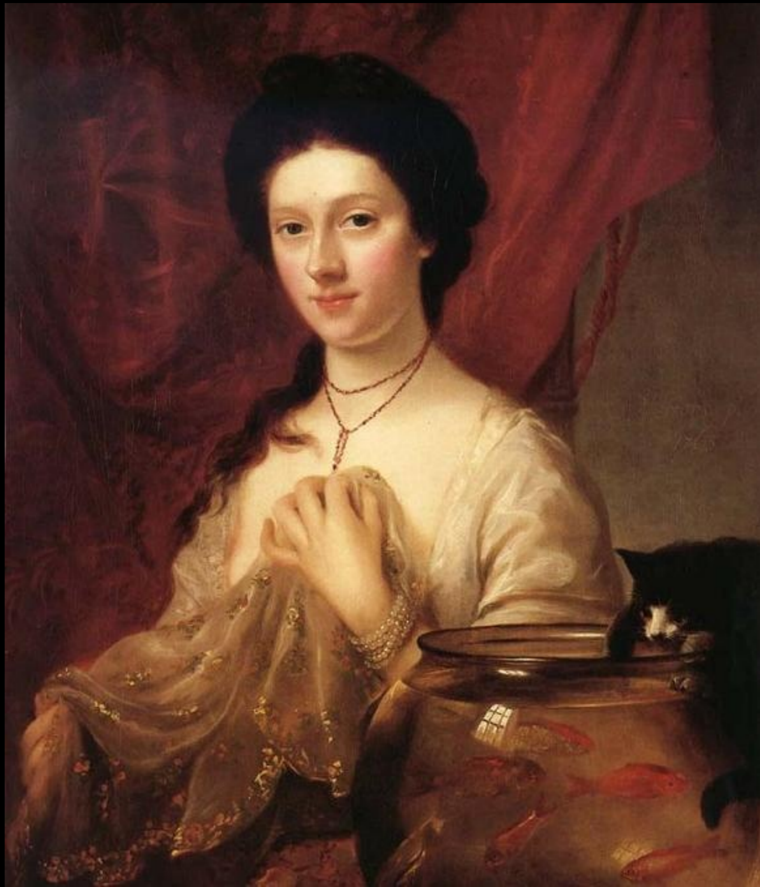
Catherine Maria "Kitty" Fisher by Nathaniel Hone c. 1765