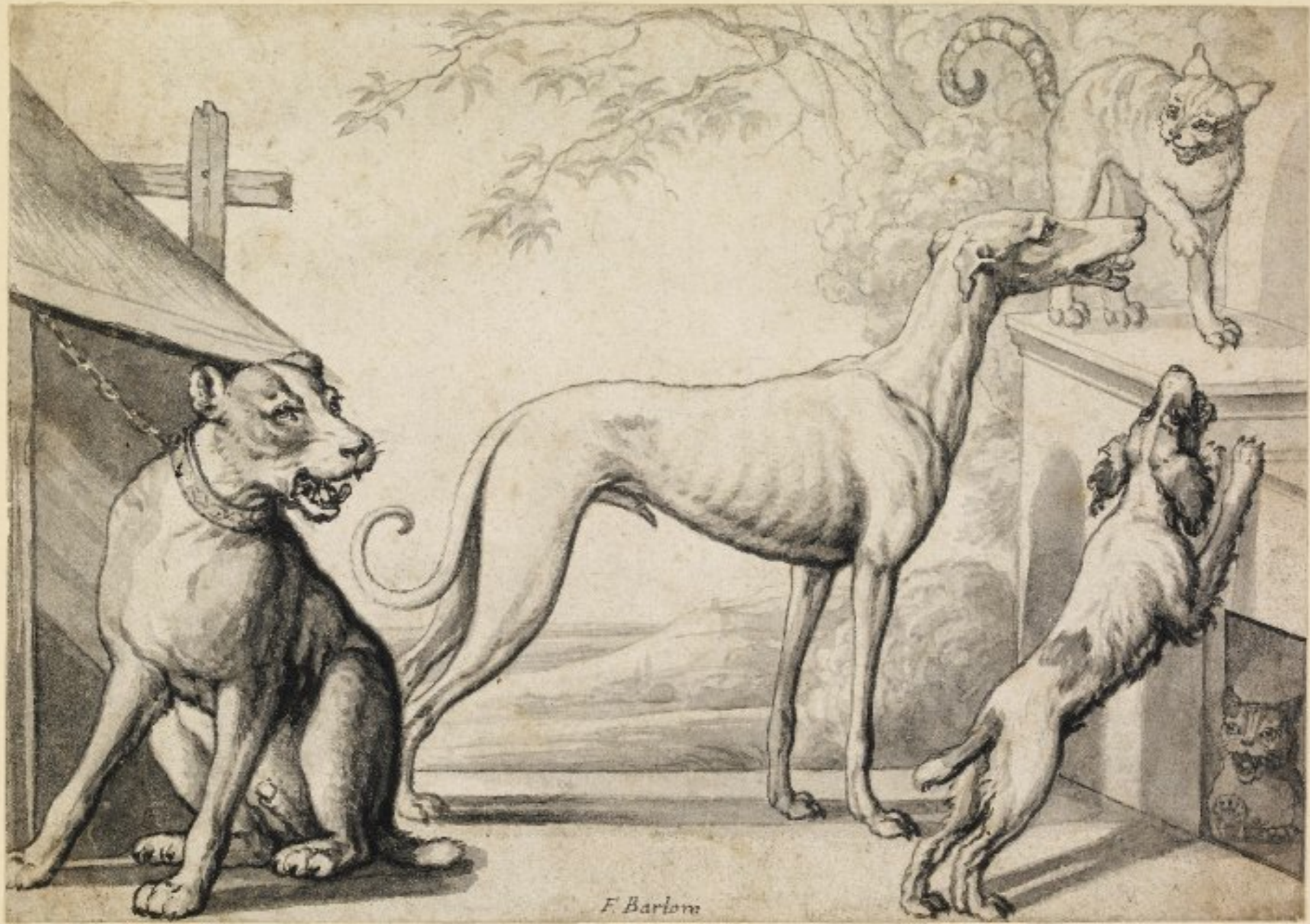
by Francis Barlow c. 1626 - 1704 (The British Museum)