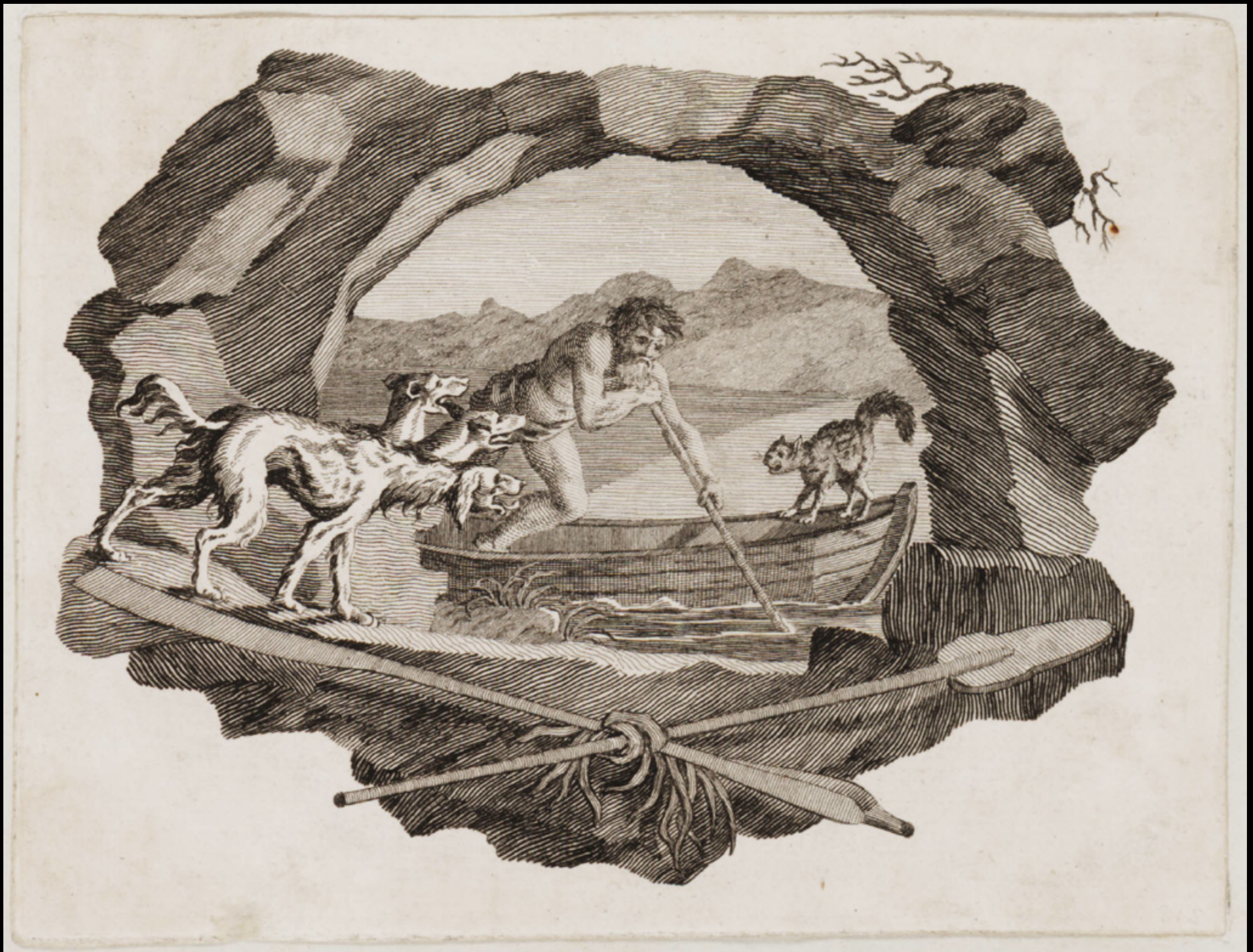
Tailpiece to "ODE on the Death of a Favourite CAT" by Richard Bentley 1753 (Lewis Walpole Library)