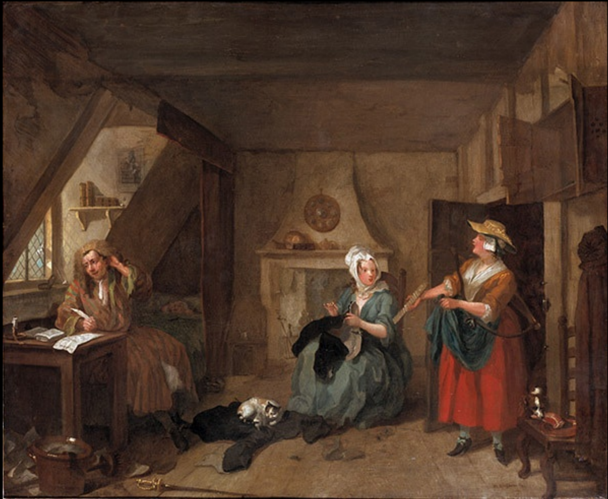
"The Distressed Poet" by William Hogarth c. 1733 - 1735 (Birmingham Art Museum)