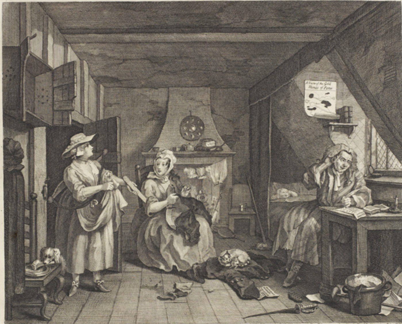
THE DISTRESSED POET.