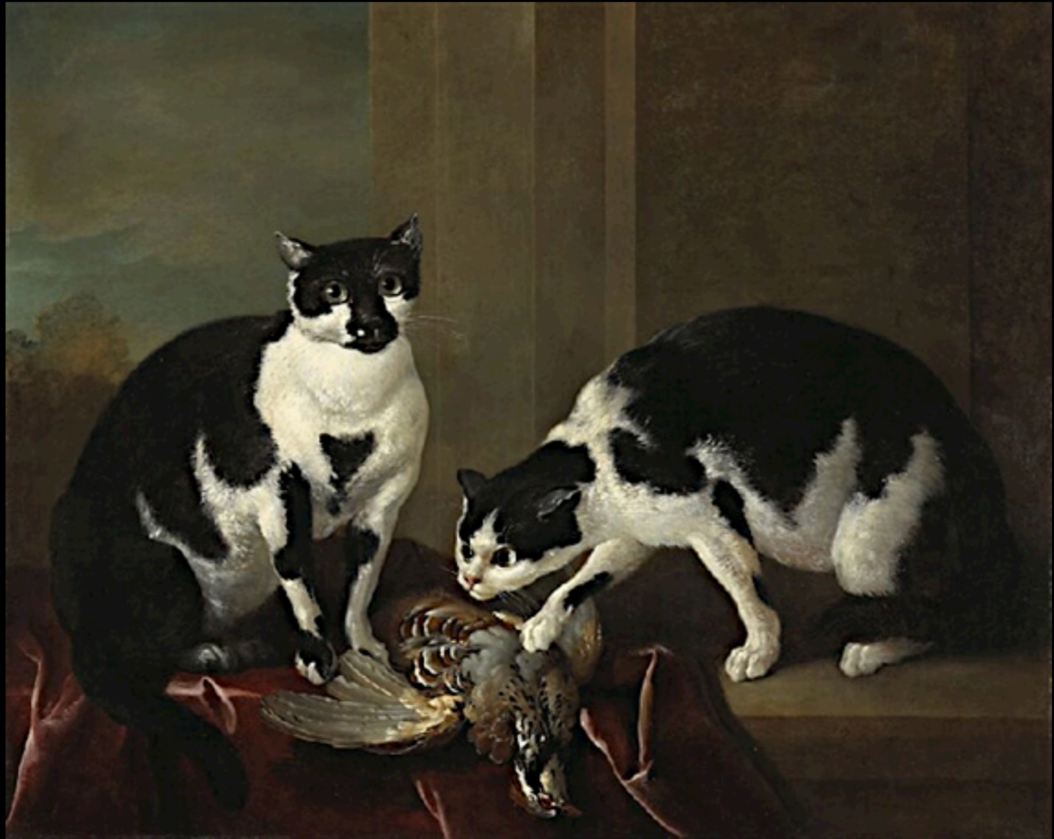
Two Cats by Jean-Baptiste Oudry c. 1725 (National Gallery of Canada)