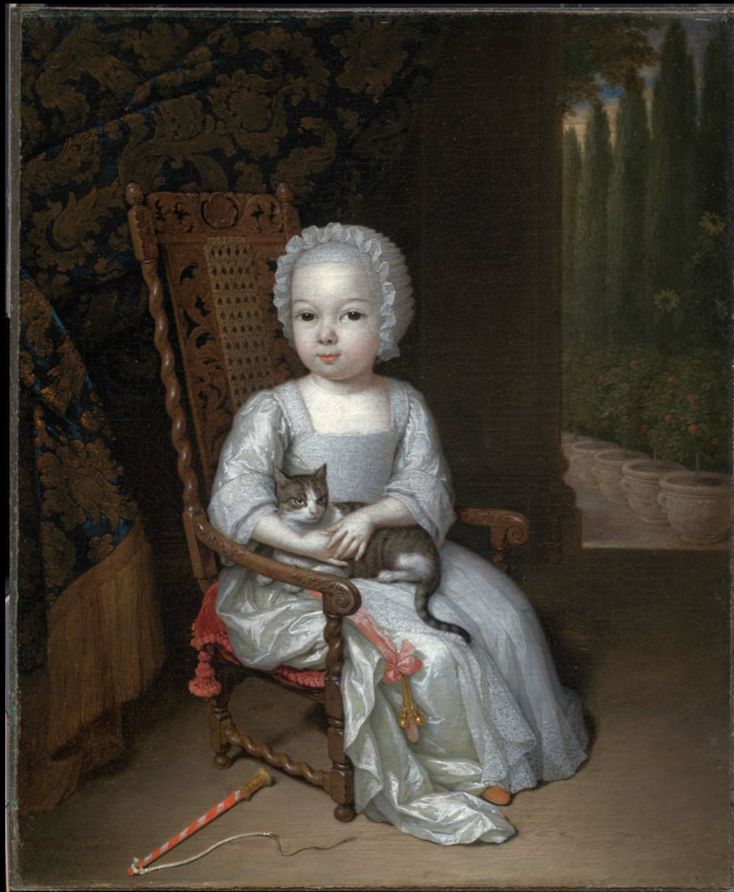
Portrait of a Dutch Girl with a Cat by Constanjin Netscher 1711 (Museum of Fine Arts, Boston)