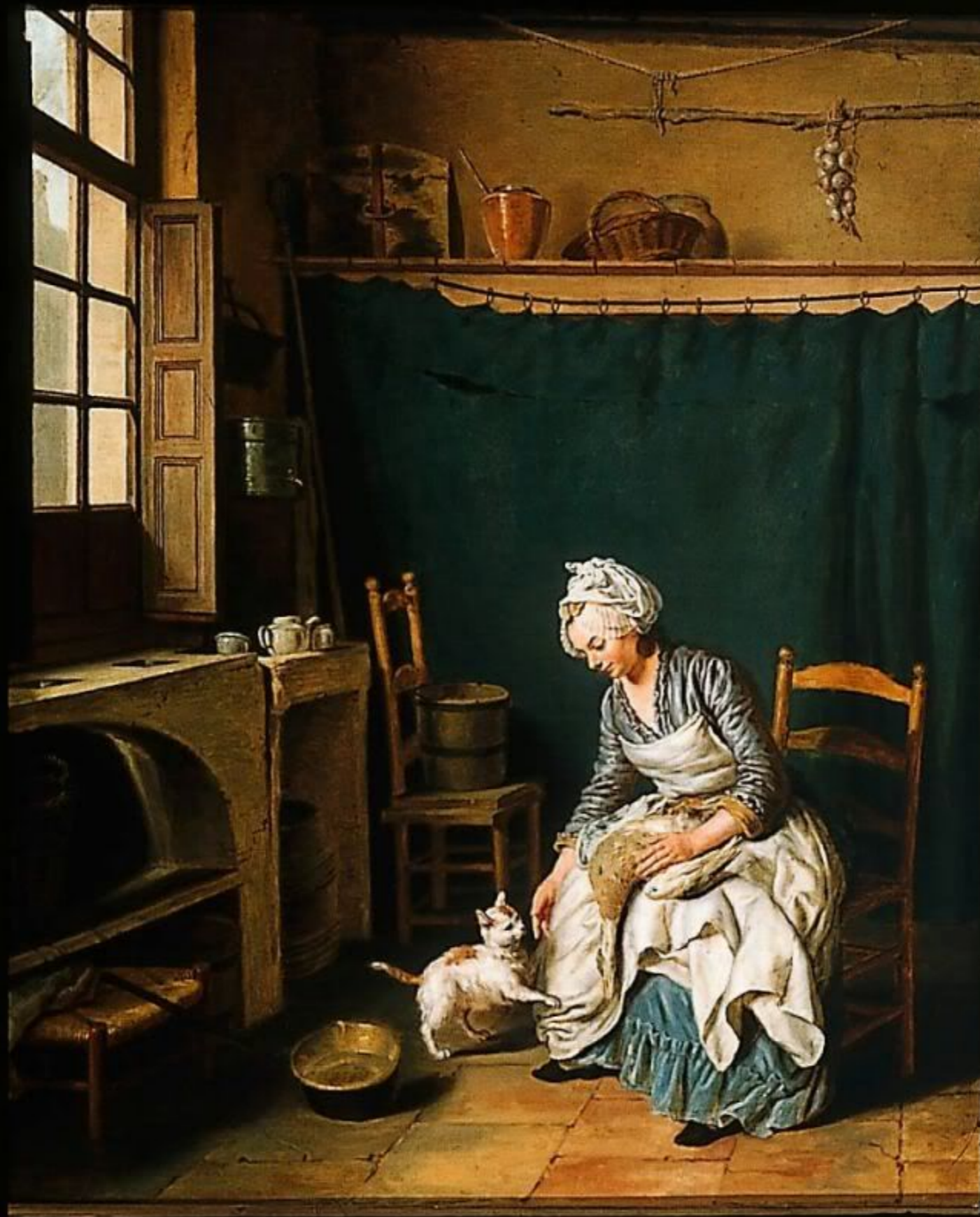
Portrait of a French Girl Plucking a Chicken by Nicolas-Bernard Lépicié (1735-1784)