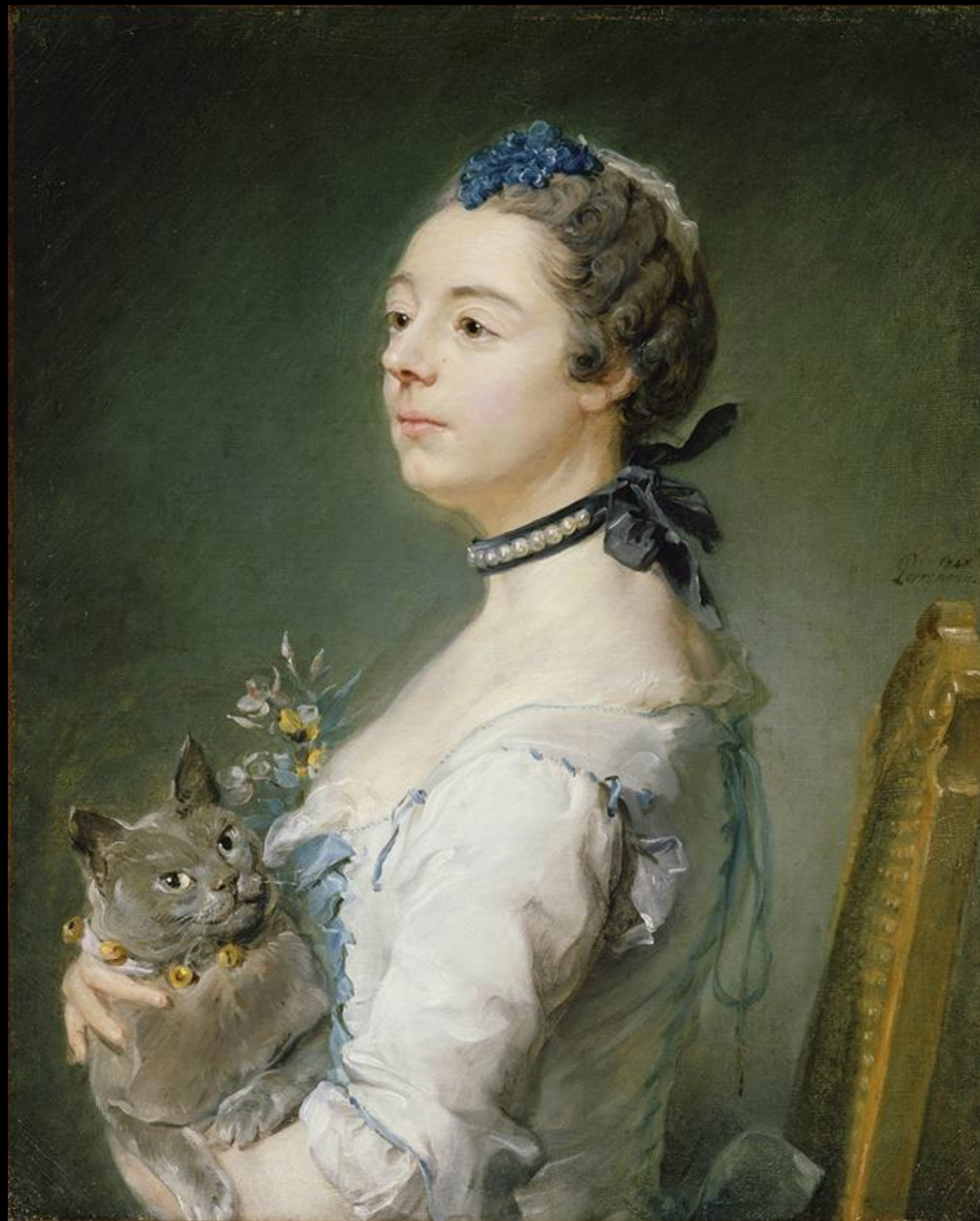
Magdleine Pinceloup de la Grange, née de Parseval by Jean-Baptiste Perronneau 1747 (J. Paul Getty Museum)