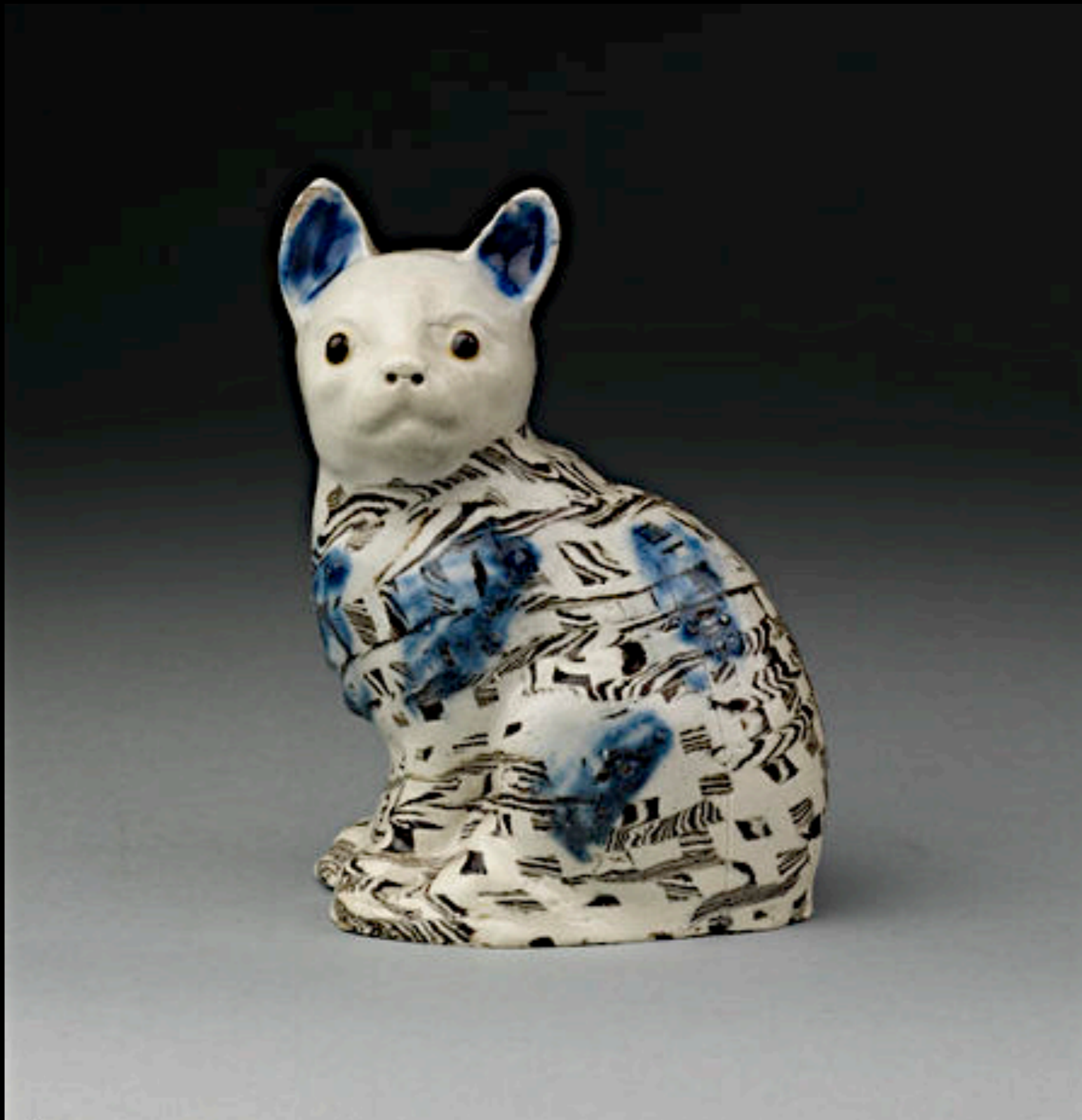
English Salt Glazed Stoneware Cat from Staffordshire c. 1750 - 1760 (Victoria & Albert)