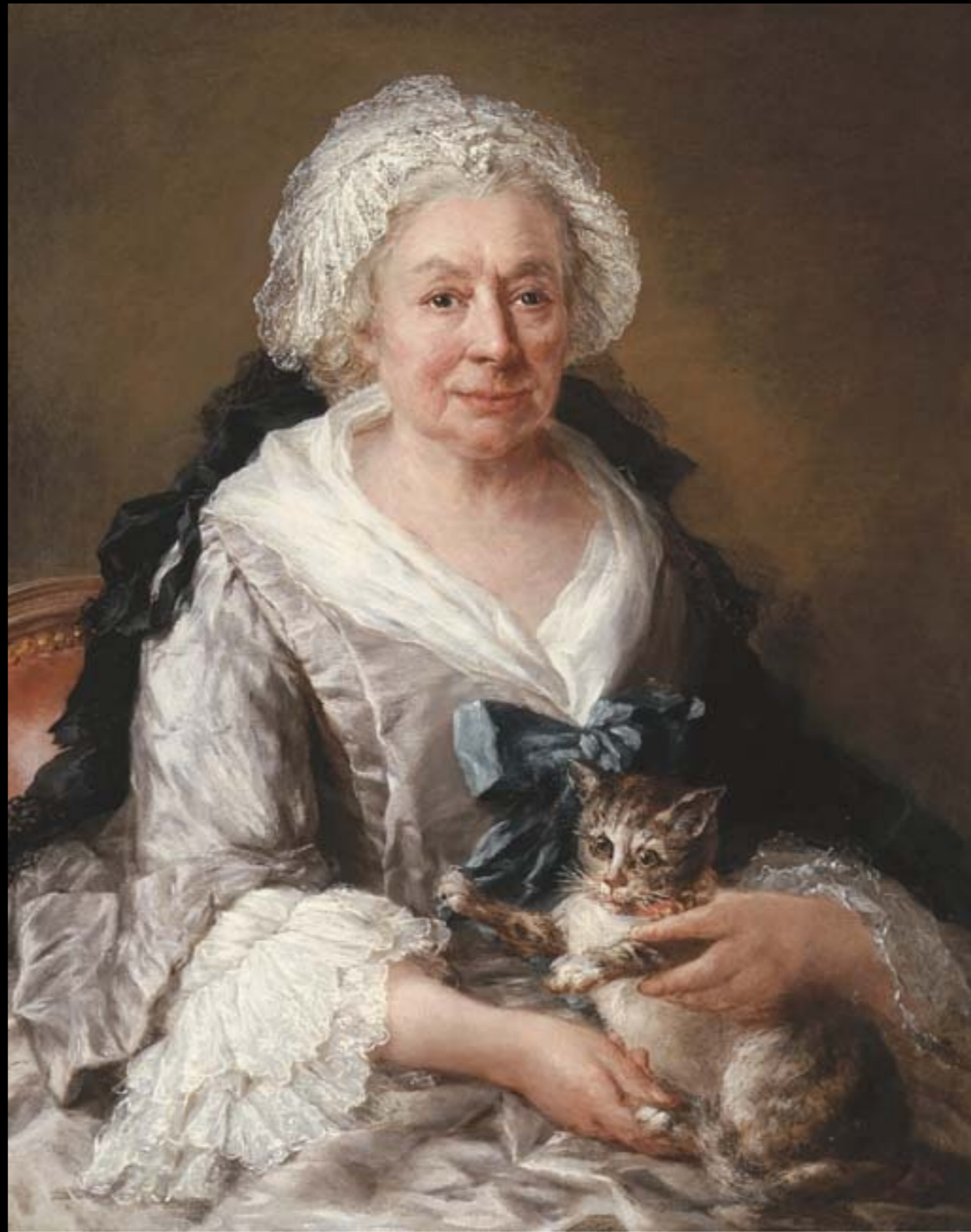
Woman with a Cat by Francesco Zuccarelli (1702 - 1788)