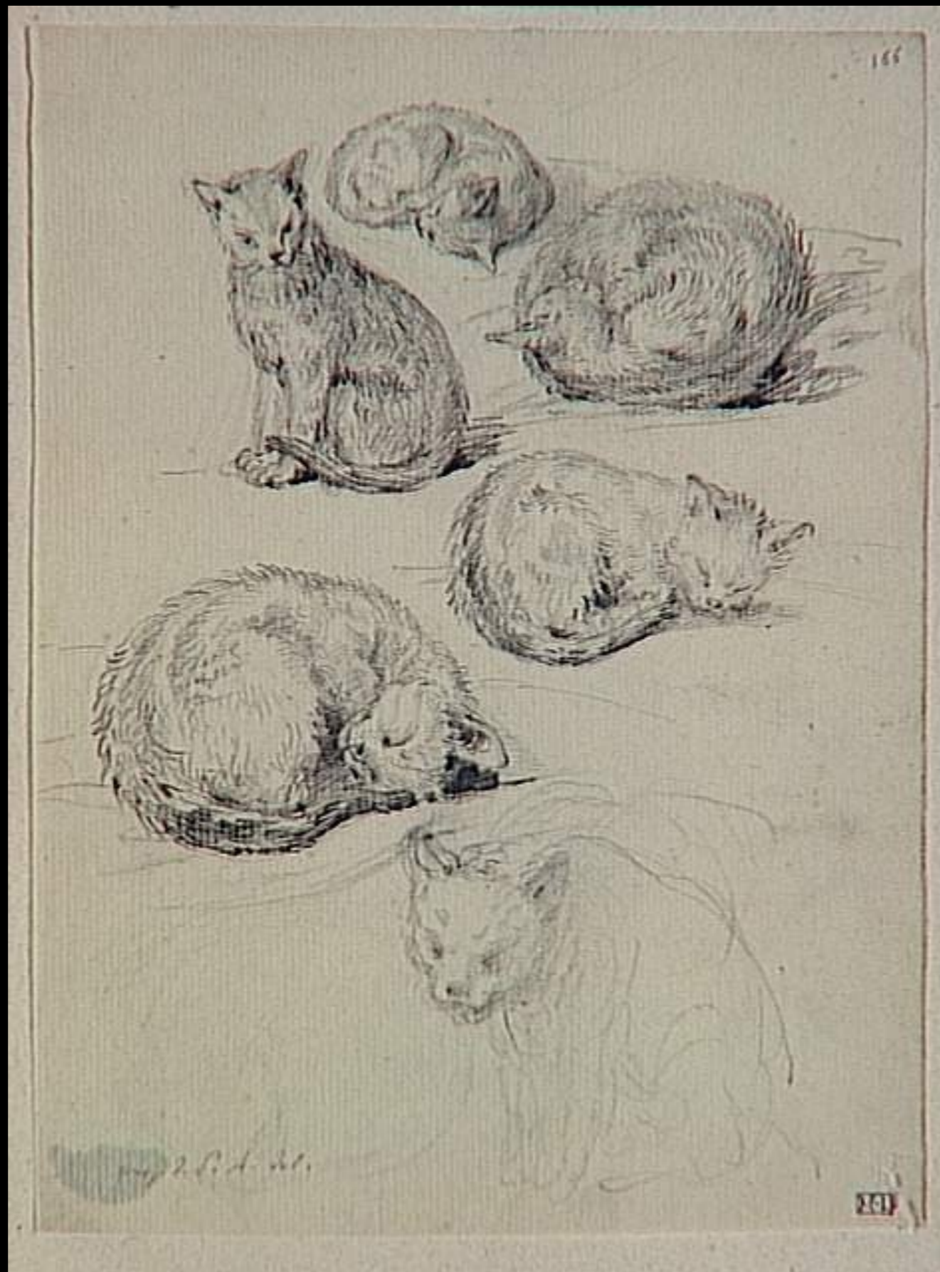
Étude de six chats by Augustin de Saint-Aubin (1736-1807)