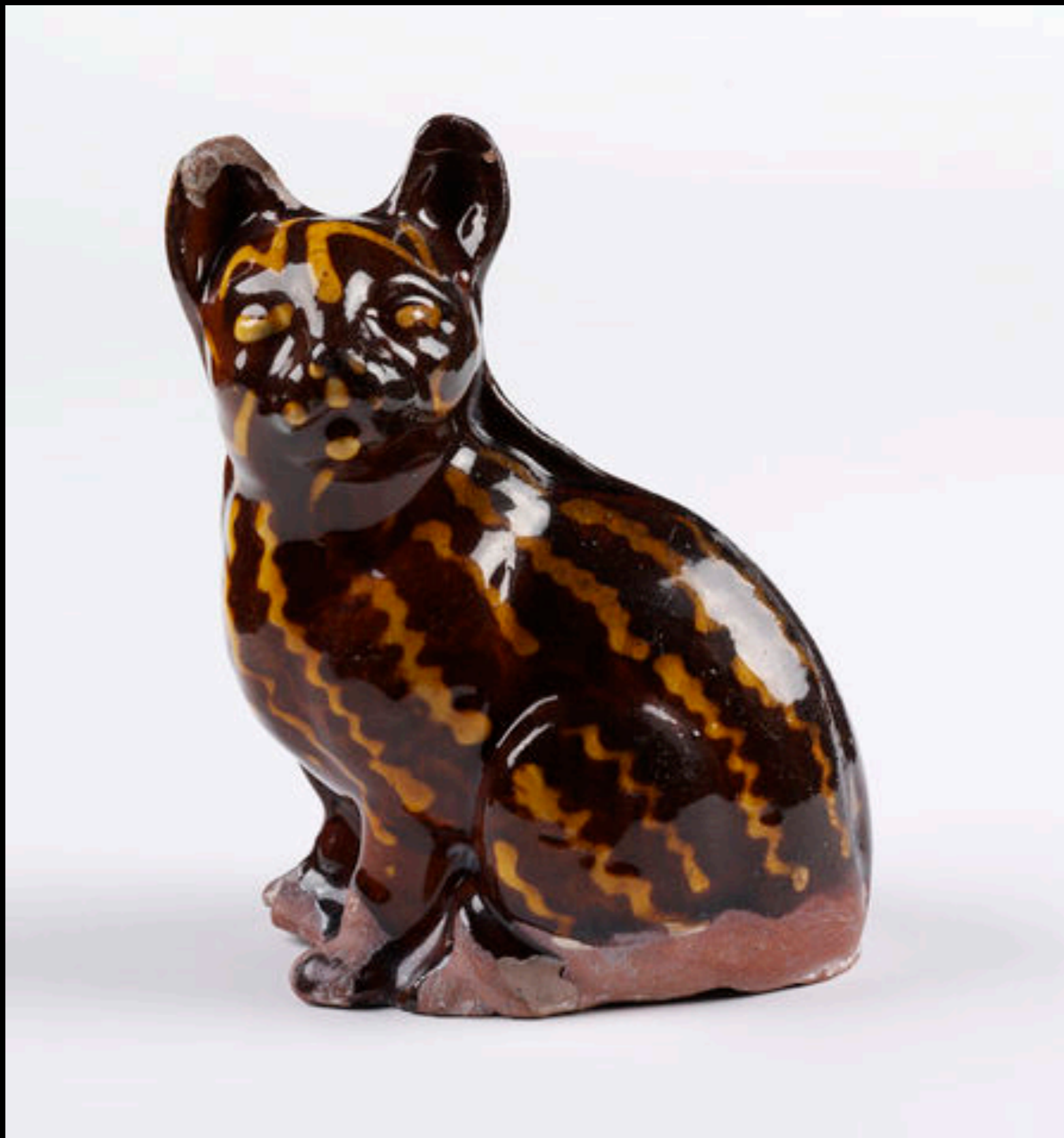
English Lead Glazed Slip Decorated Earthenware Cat 18th Century (Victoria & Albert)