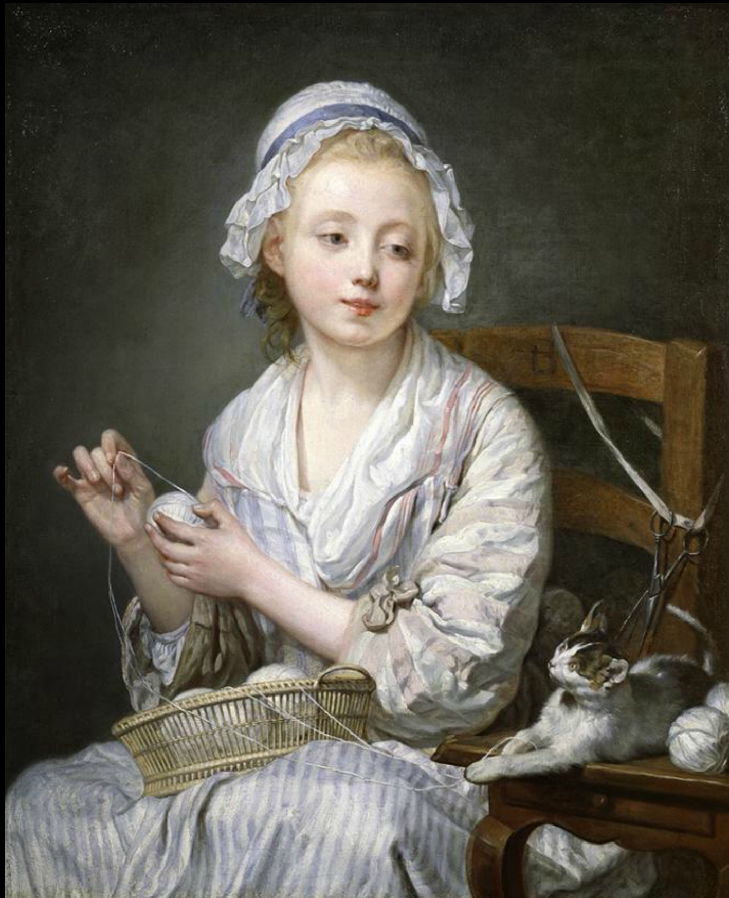
The Wool Winder by Jean-Baptiste Greuze c. 1759 (The Frick Collection)