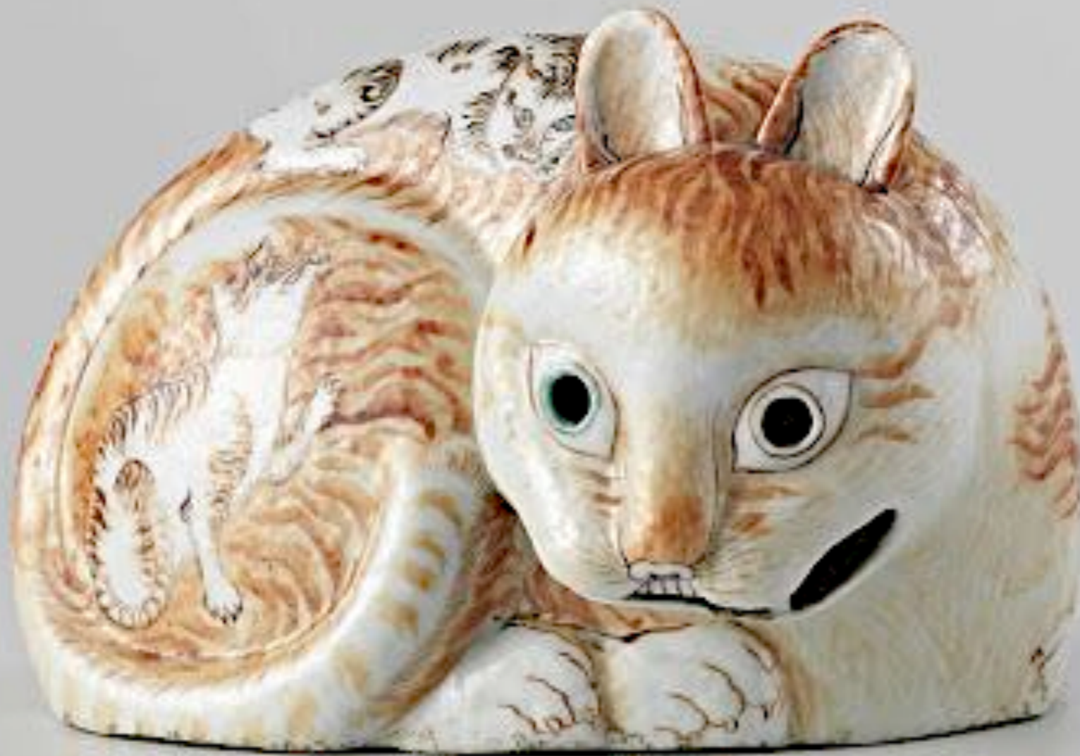
Porcelain Night Light in the Form of a Cat c. 1760 (RIJKS Museum)