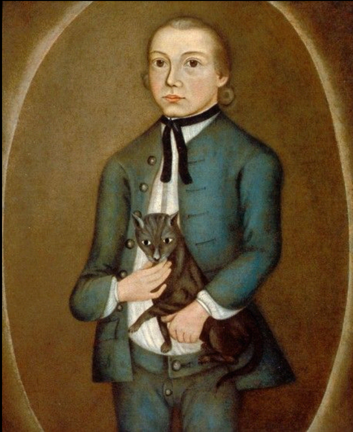
Young Man of the Tuke Family Holding a Cat by Joseph Badger