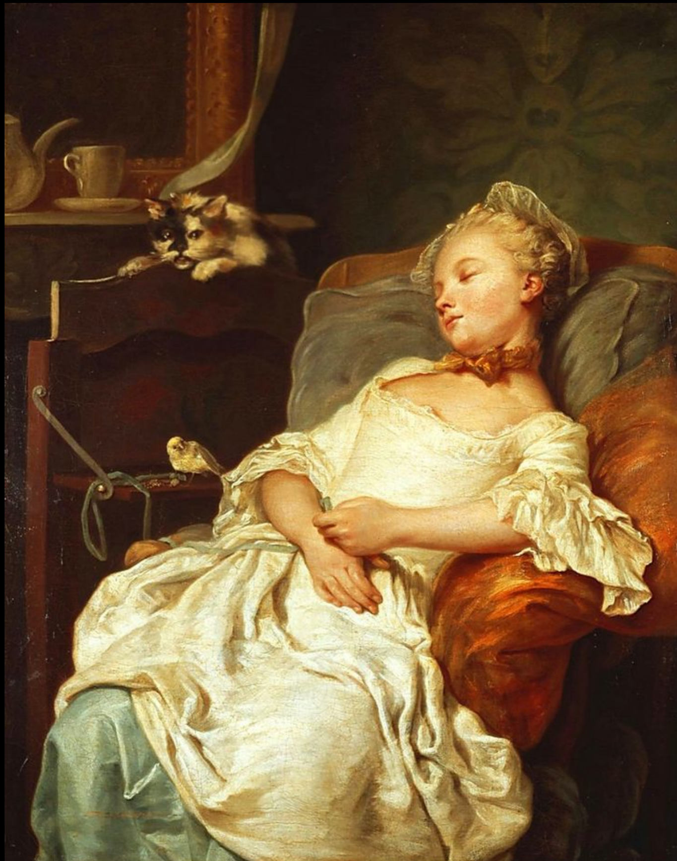
Portrait of a French Sleeping Girl by Jean François Colson 1759 (Musée des Beaux Arts de Dijon)