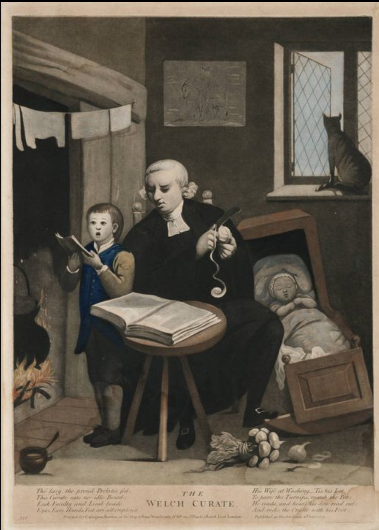
“THE WELCH CURATE” by Carington Bowles 1775