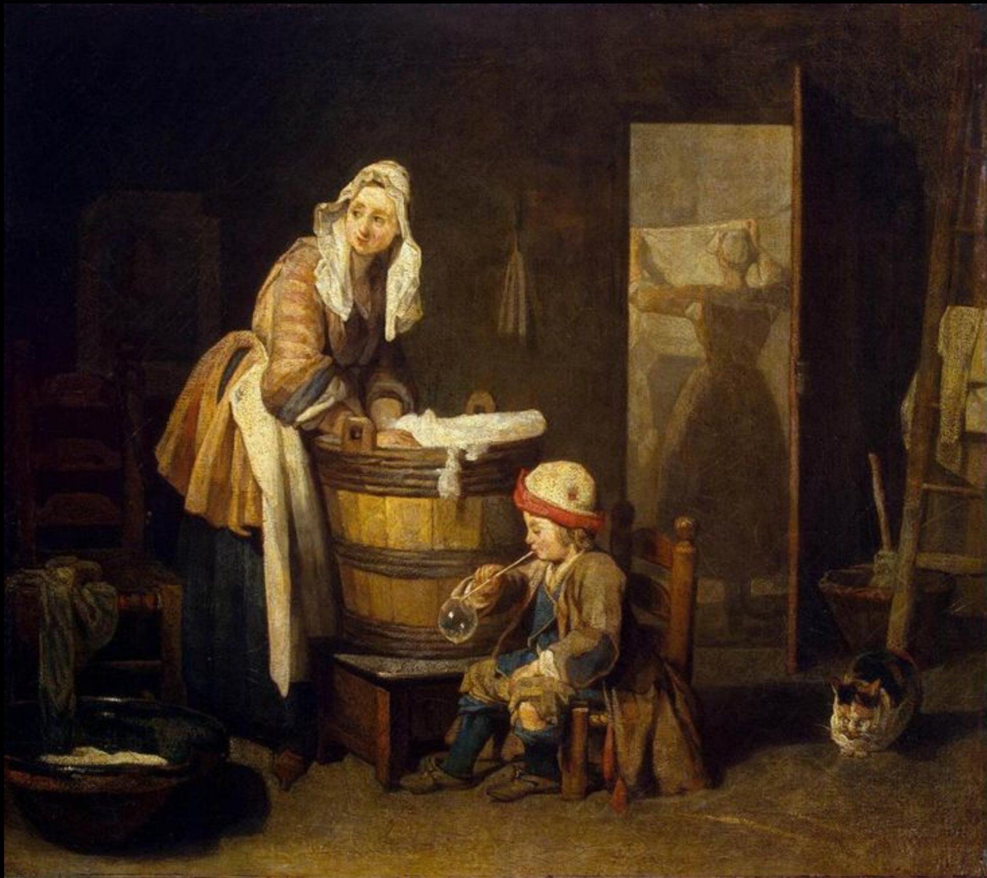
"The Laundress" by Jean Siméon Chardin c. 1735 (National Gallery of Canada)