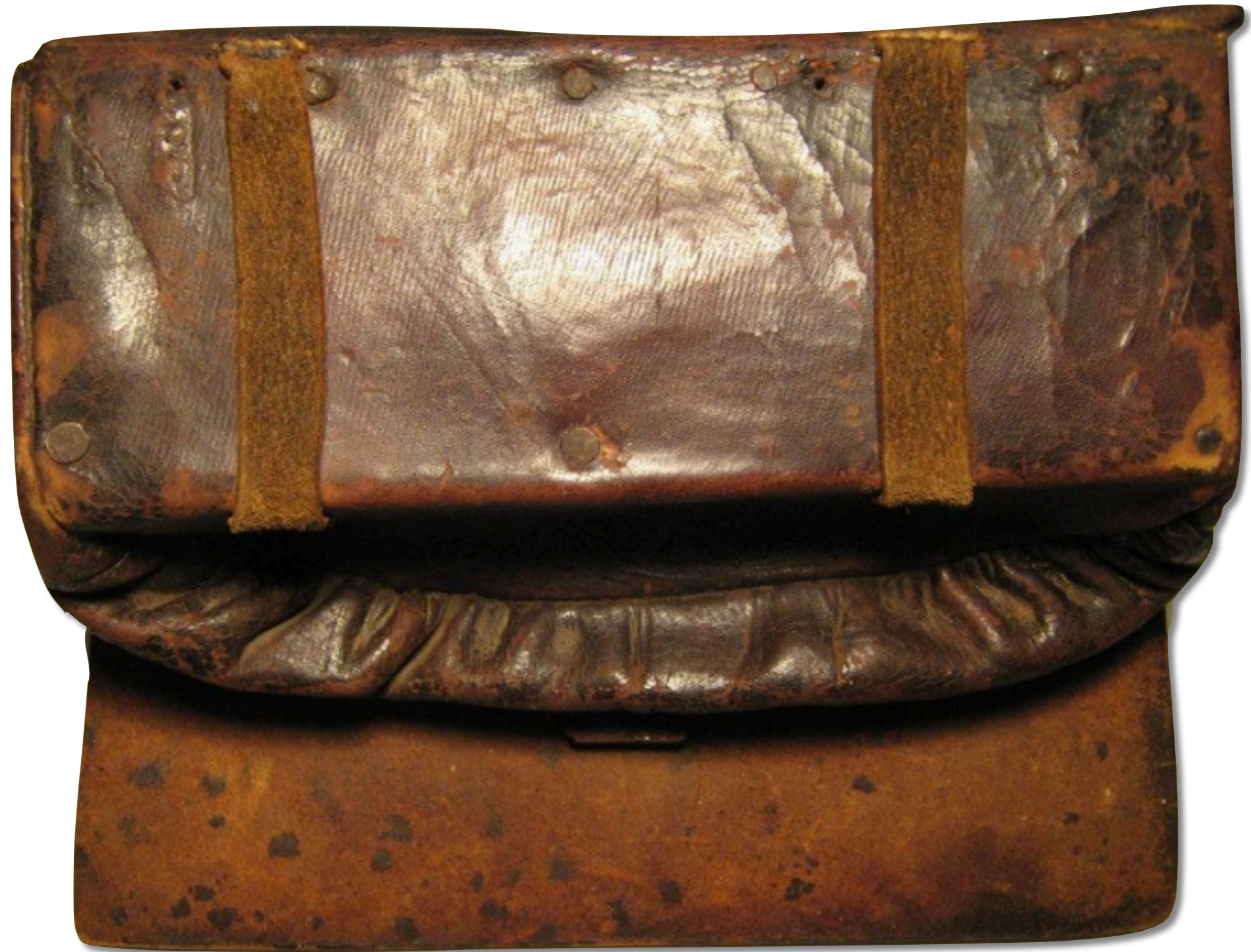
American 24 Round Cartridge Pouch Inscribed "M P W" 18th Century (Private Collection)