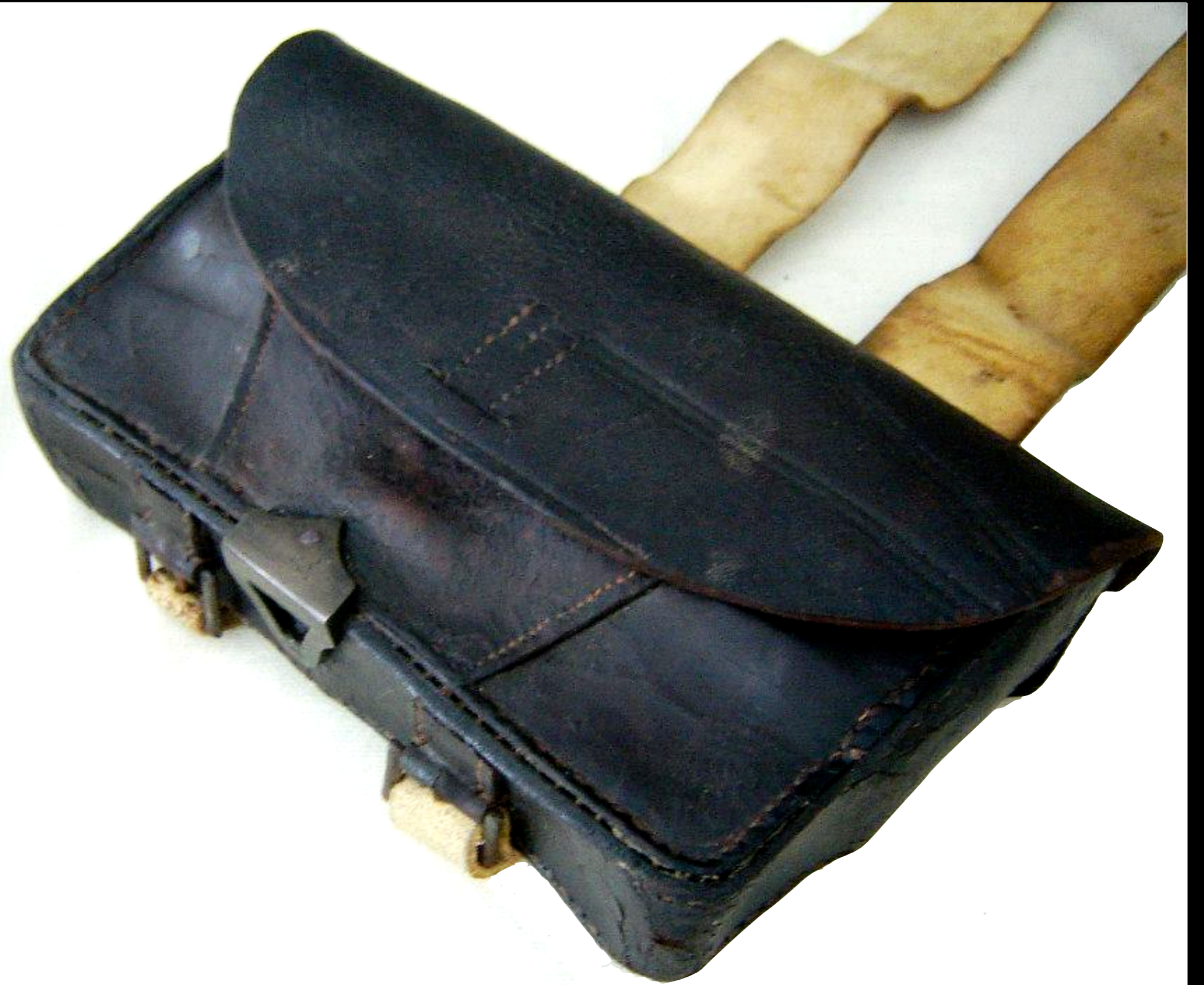
American 18 Round Modified British Light Infantry - Sergeants Pouch with Tin Tray