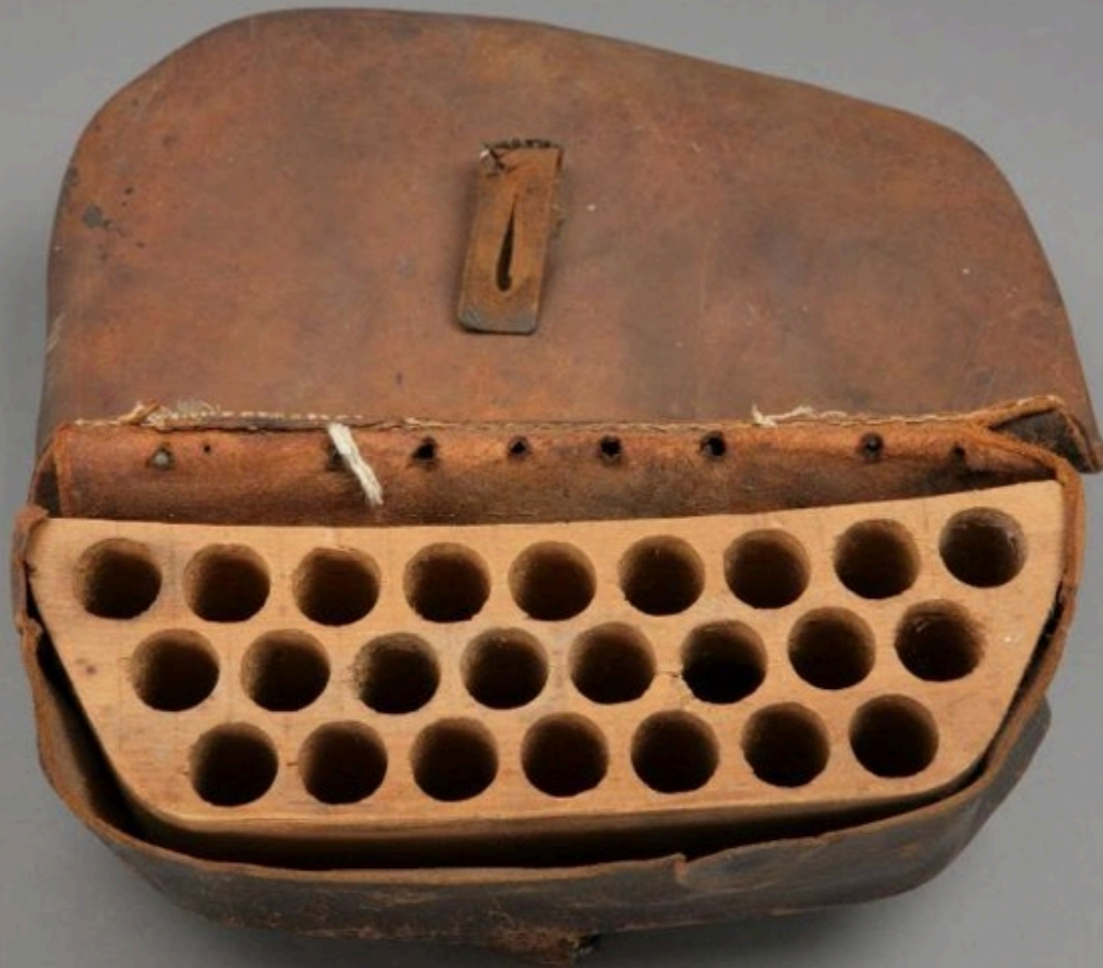
American 24 Round Cartridge Pouch 18th Century (Private Collection)