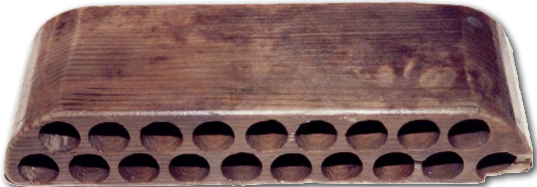
American 19 Round Cartridge Pouch Remnants. Flap Initialed "GMB" Found in Valcour Bay, Lake Champlain c. 1776 (Lake Champlain Maritime Museum - Photos Courtesy Edwin R. Scollon)