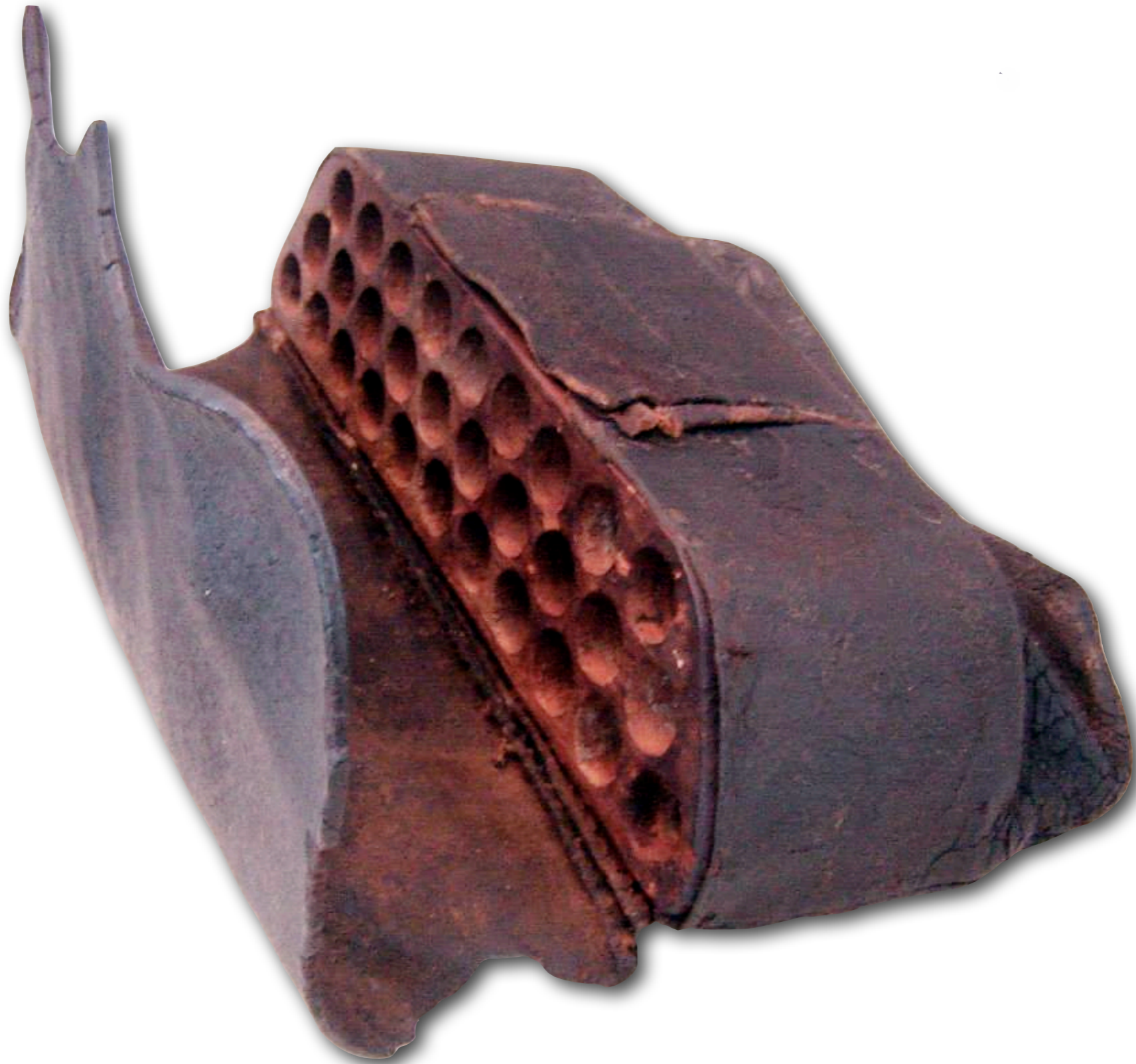
American 30 Round Cartridge Pouch 18th Century

(Colonel Craig J. Nannos Collection - Photograph Courtesy Andrew Watson Kirk)