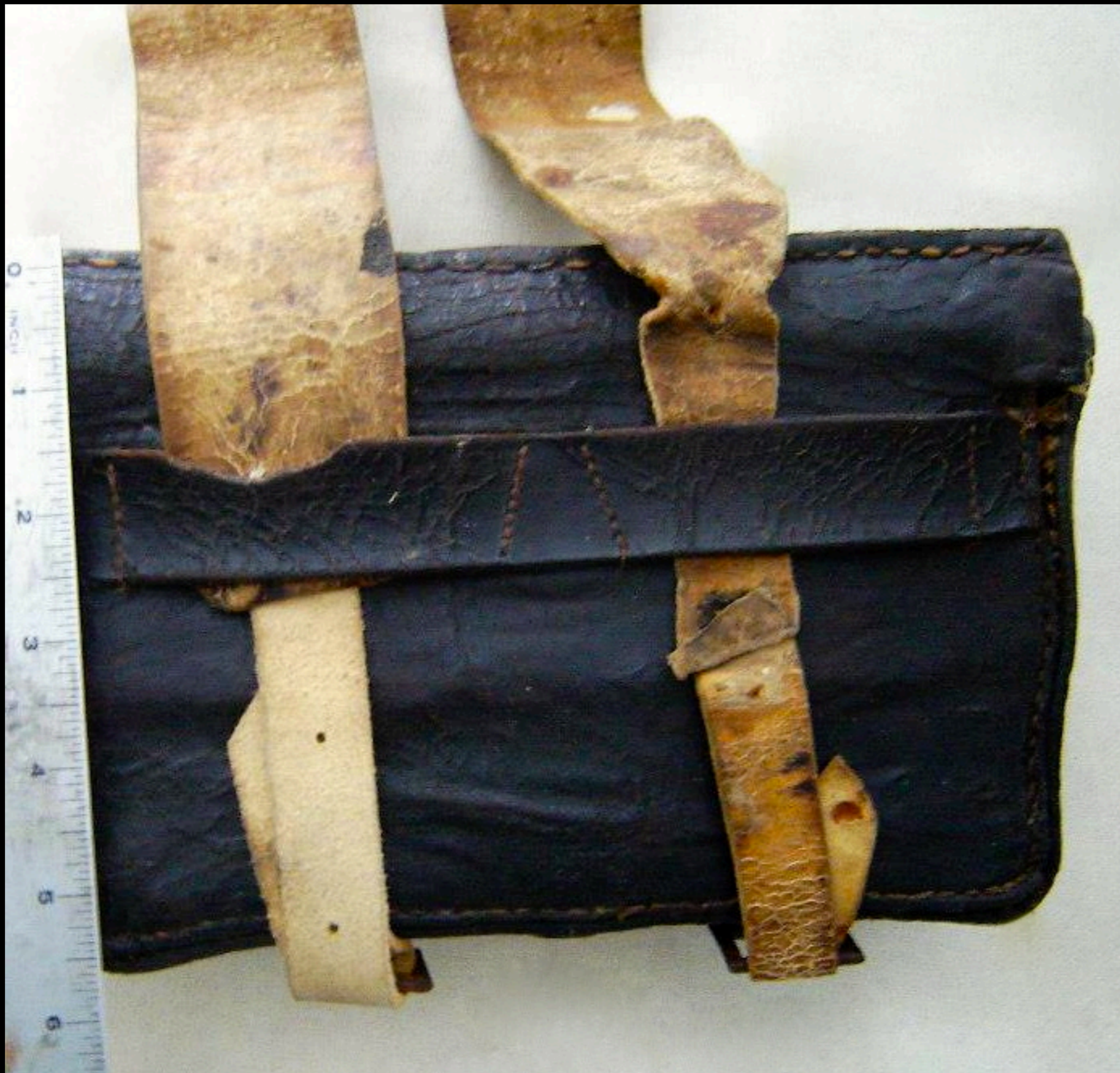
American 18 Round Modified British Light Infantry - Sergeants Pouch with Tin Tray