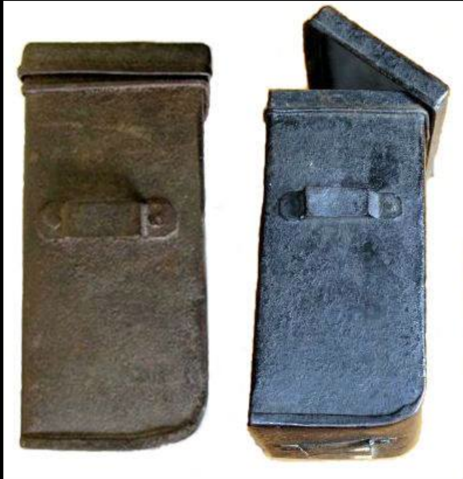
Tin Cartridge Canisters 18th Century (West Point Museum (Left). Bergen County Historical Society (Right))