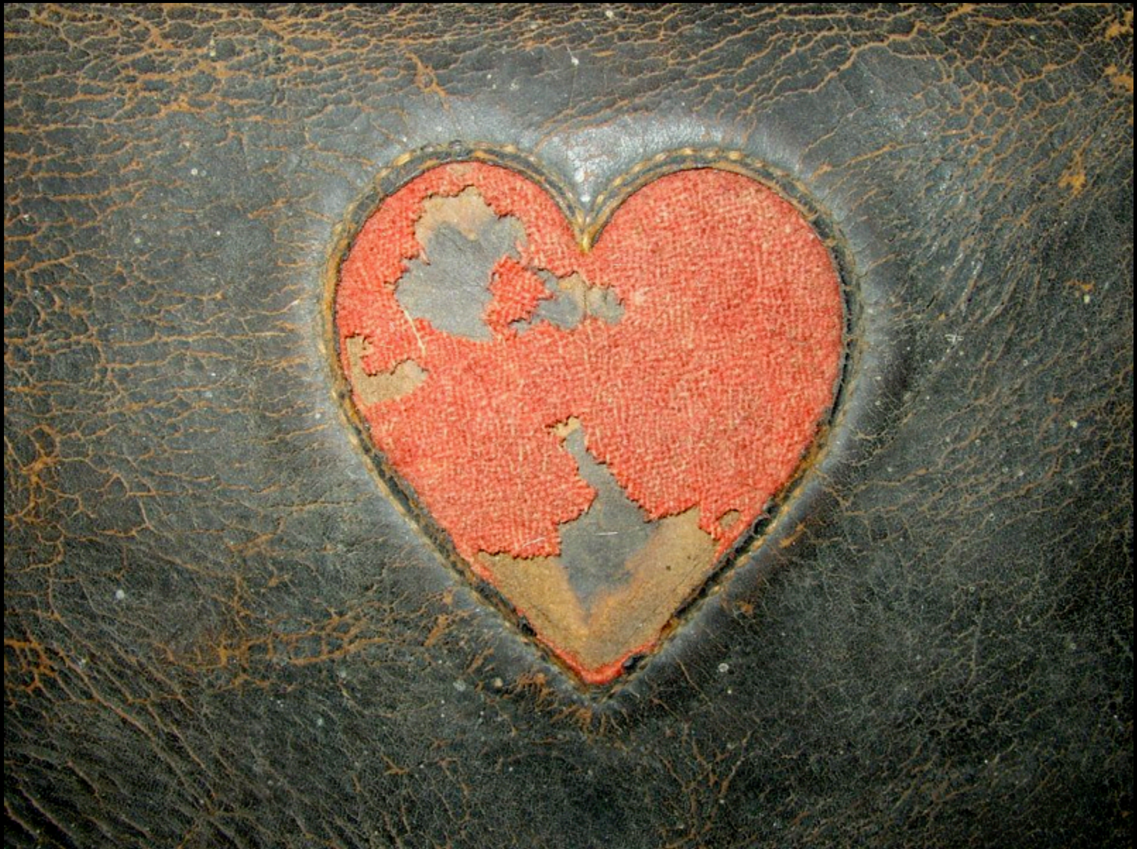
American Cartridge Pouch Tailored Bottom, Linen and Wool Shoulder Strap, Red Wool Heart on Flap. c. 1770 - 1800 (Private Collection)