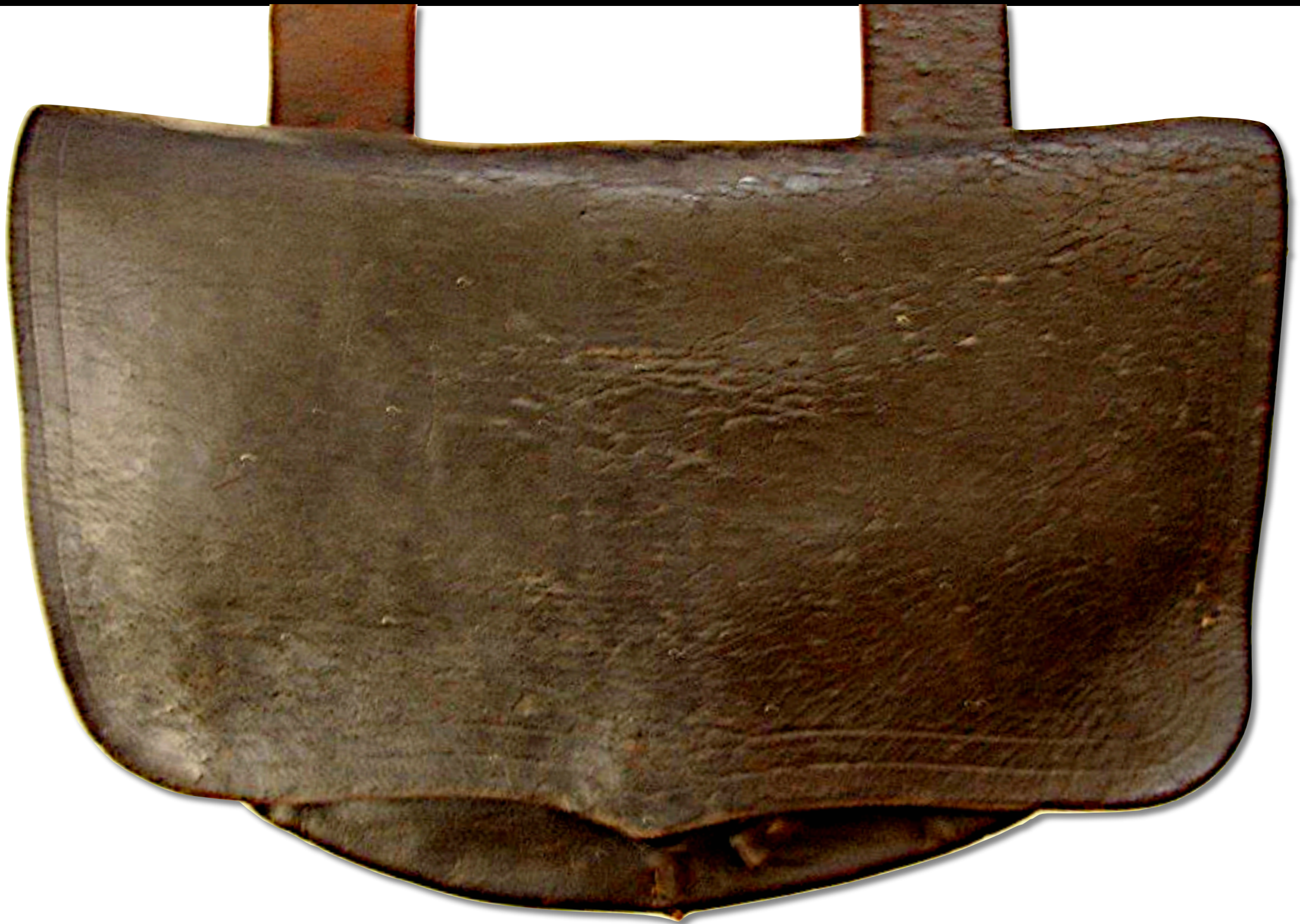
American Cartridge Pouch 18th Century (Private Collection)