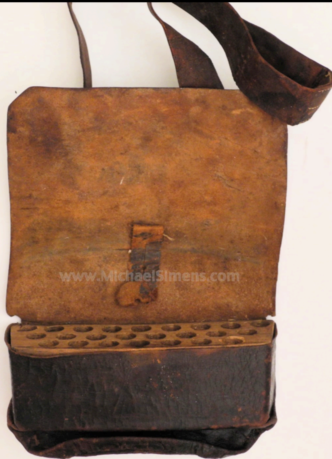
American 24 Round Cartridge Pouch 18th Century