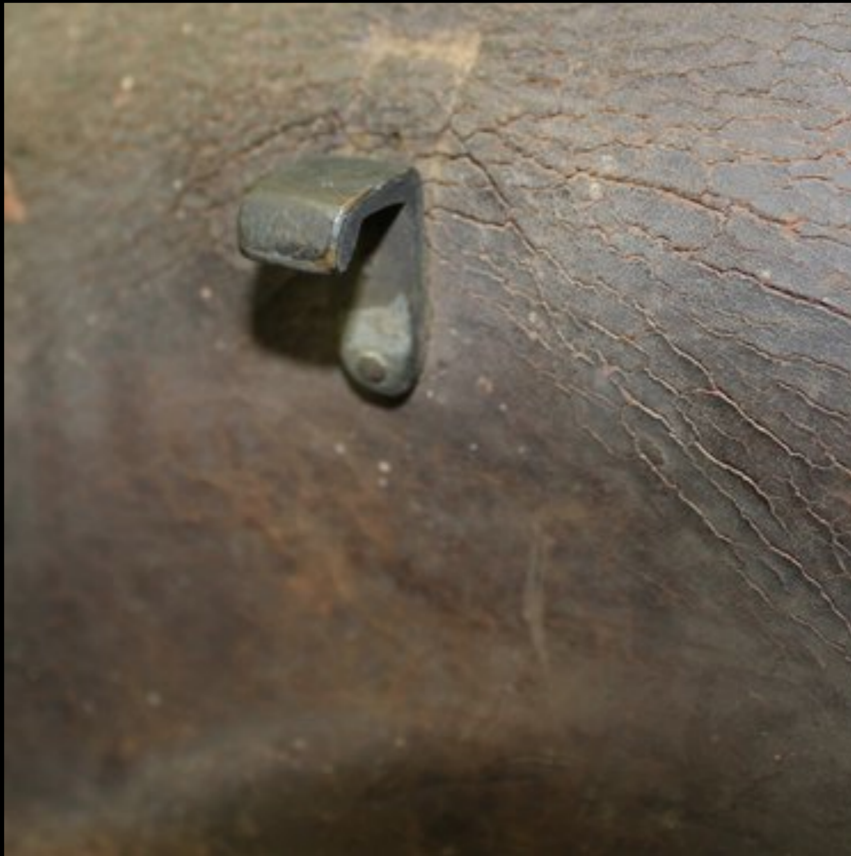
American New Model Cartridge Pouch of 1779 2nd Company - 6th Regiment - Possibly Connecticut (Don Troiani)