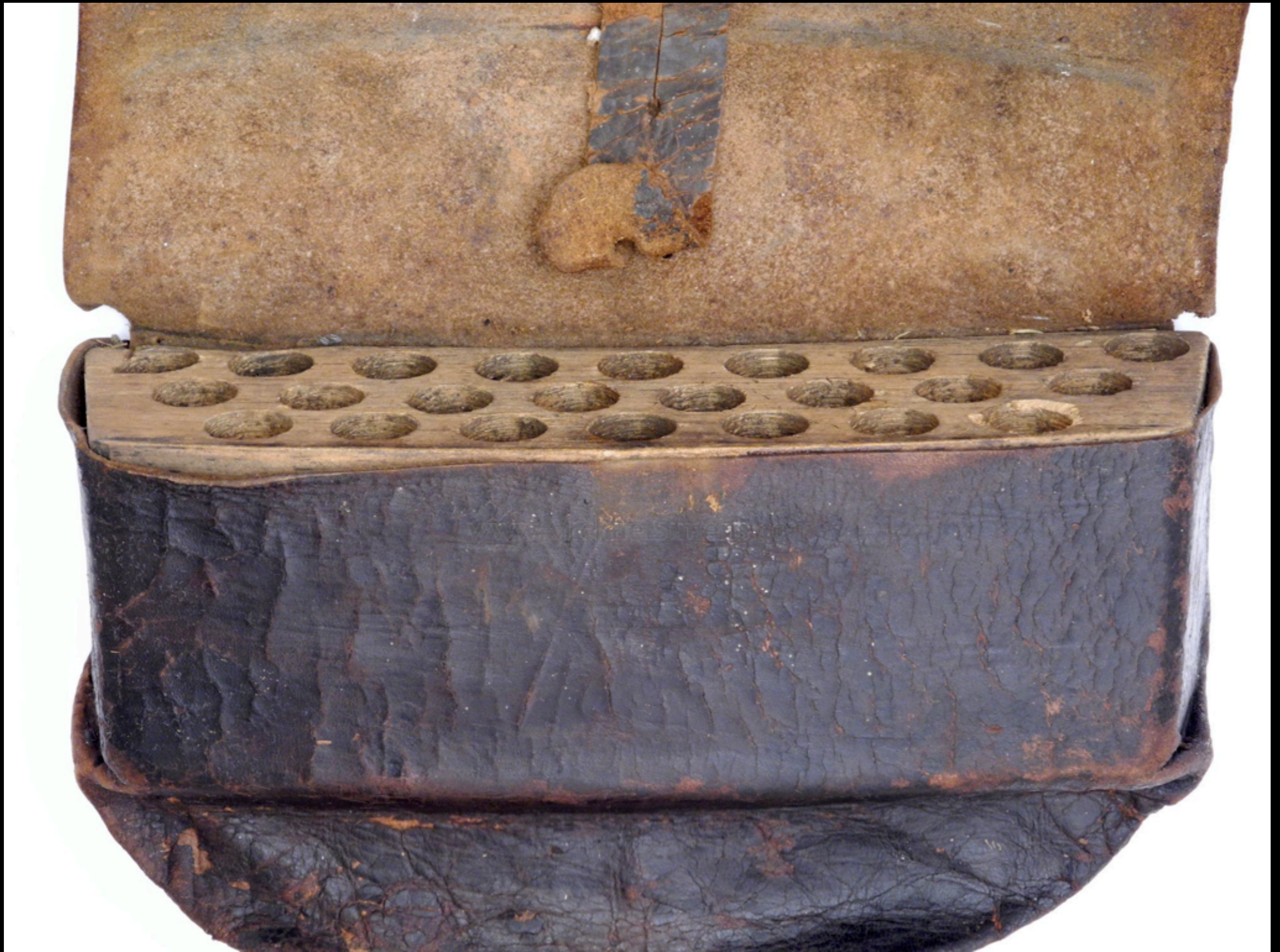
American 24 Round Cartridge Pouch 18th Century