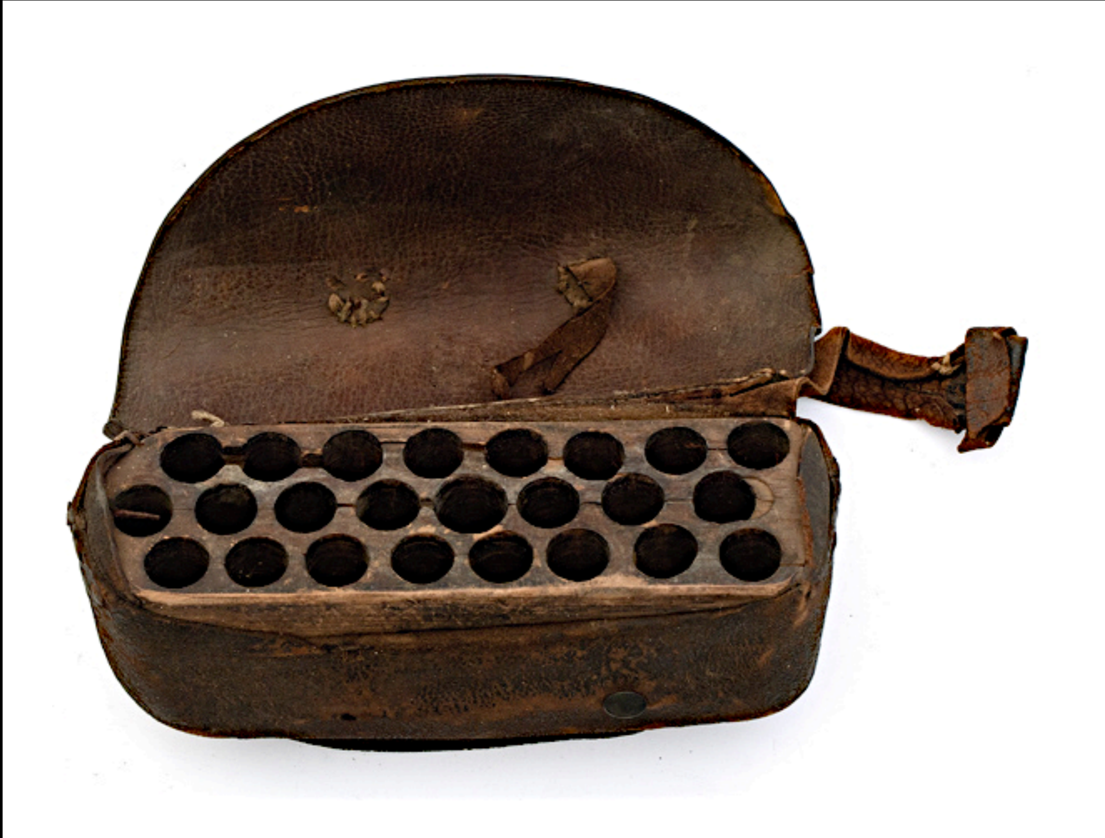
American 24 Round Cartridge Pouch Converted to a Cartridge Box