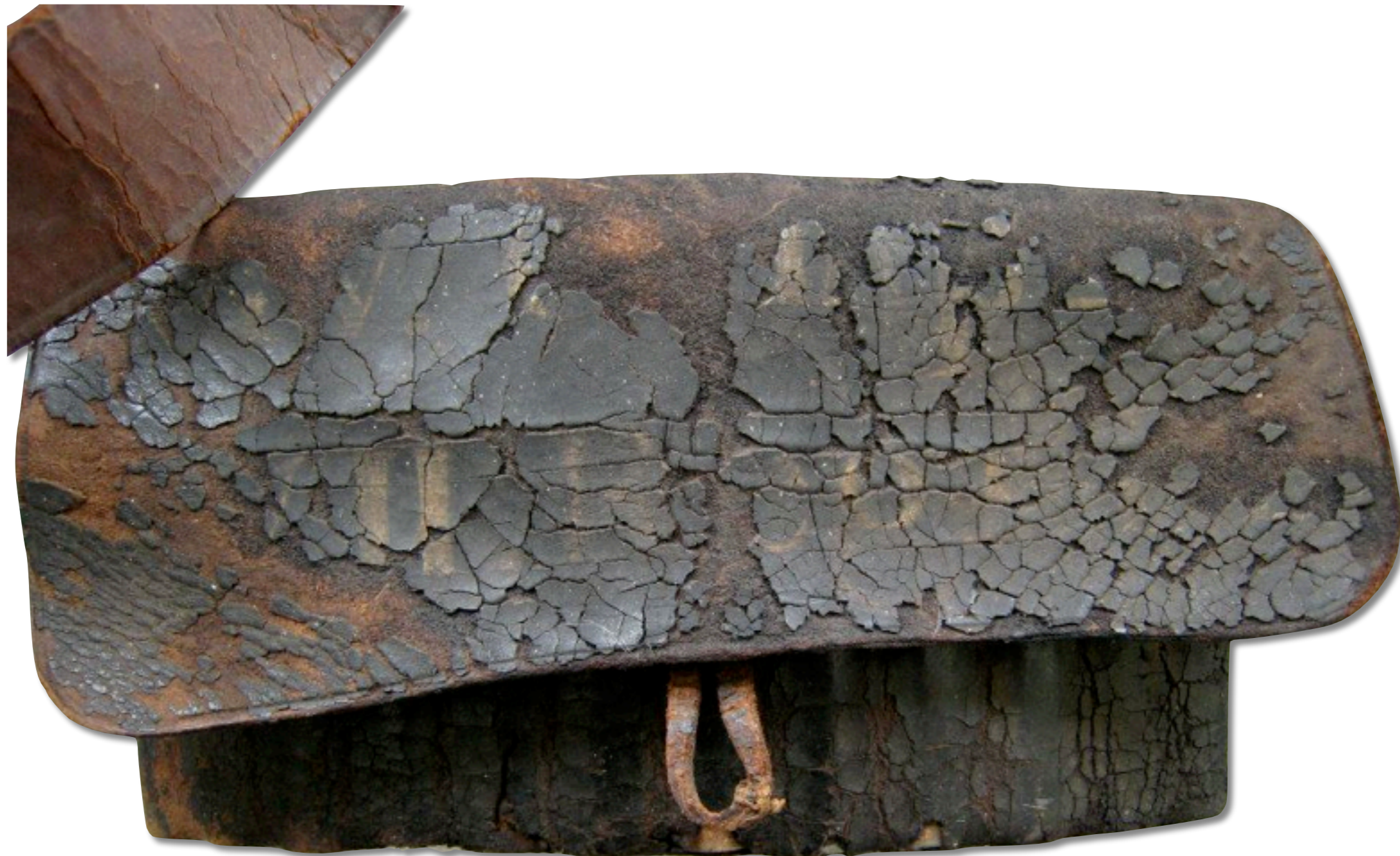
Belly Box with 12 Tin Tubes Marked "IV Comp VIII Regt." (Private Collection)