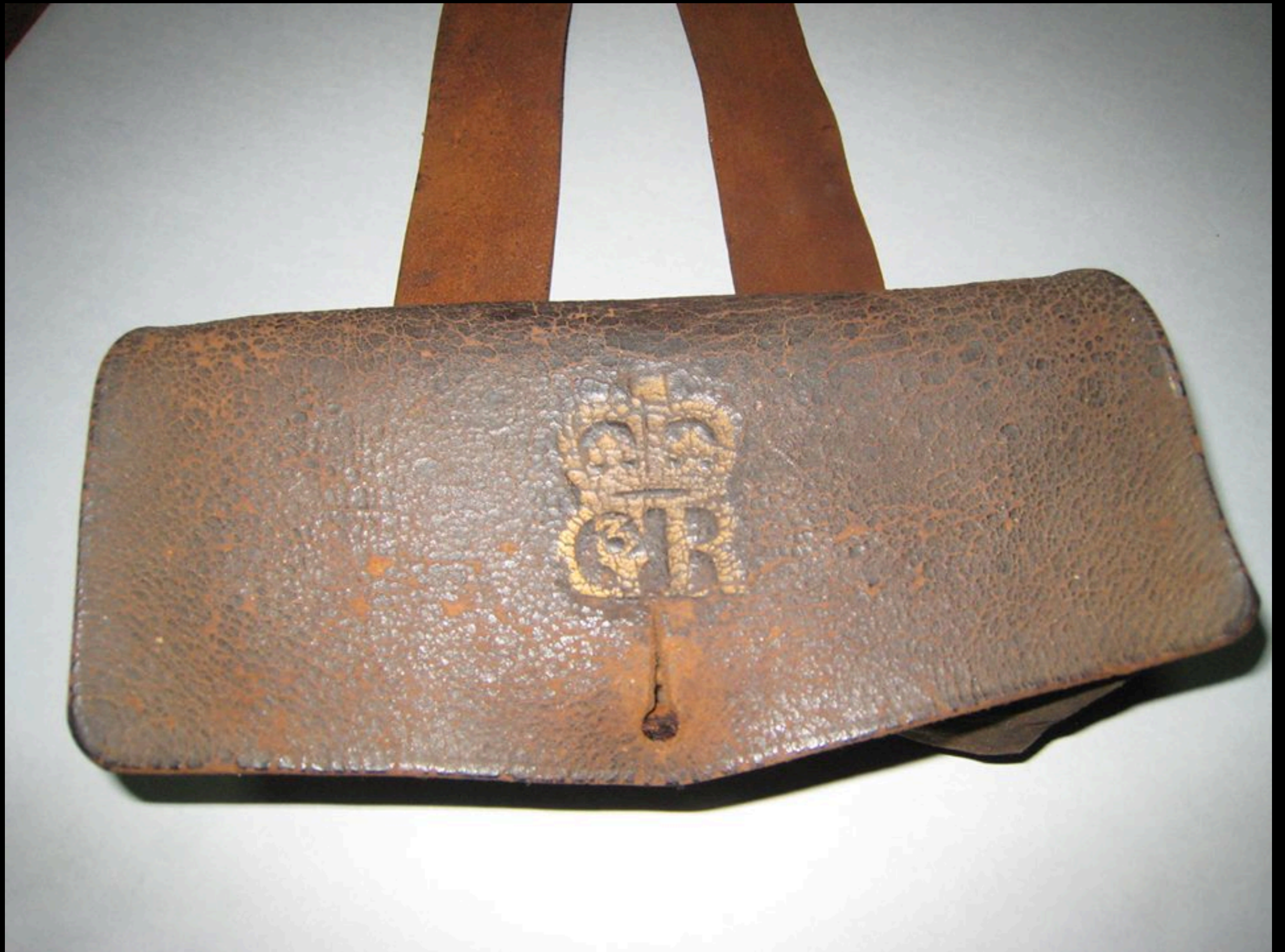
British Cartridge Box Flap with Replacement 24 Hole Block, Soft Bottom, Pouch & Shoulder Straps 18th Century (Private Collection)