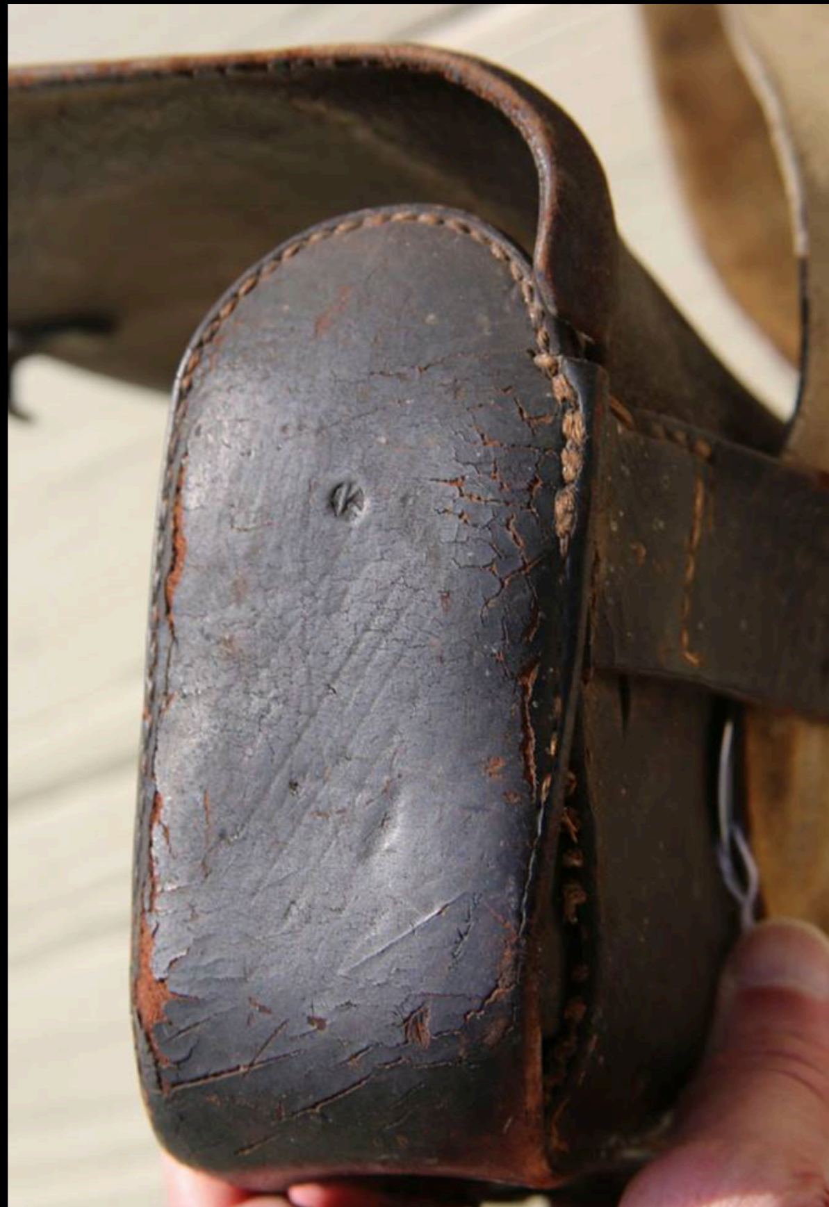
American New Model Cartridge Pouch of 1779 2nd Company - 6th Regiment - Possibly Connecticut (Don Troiani)