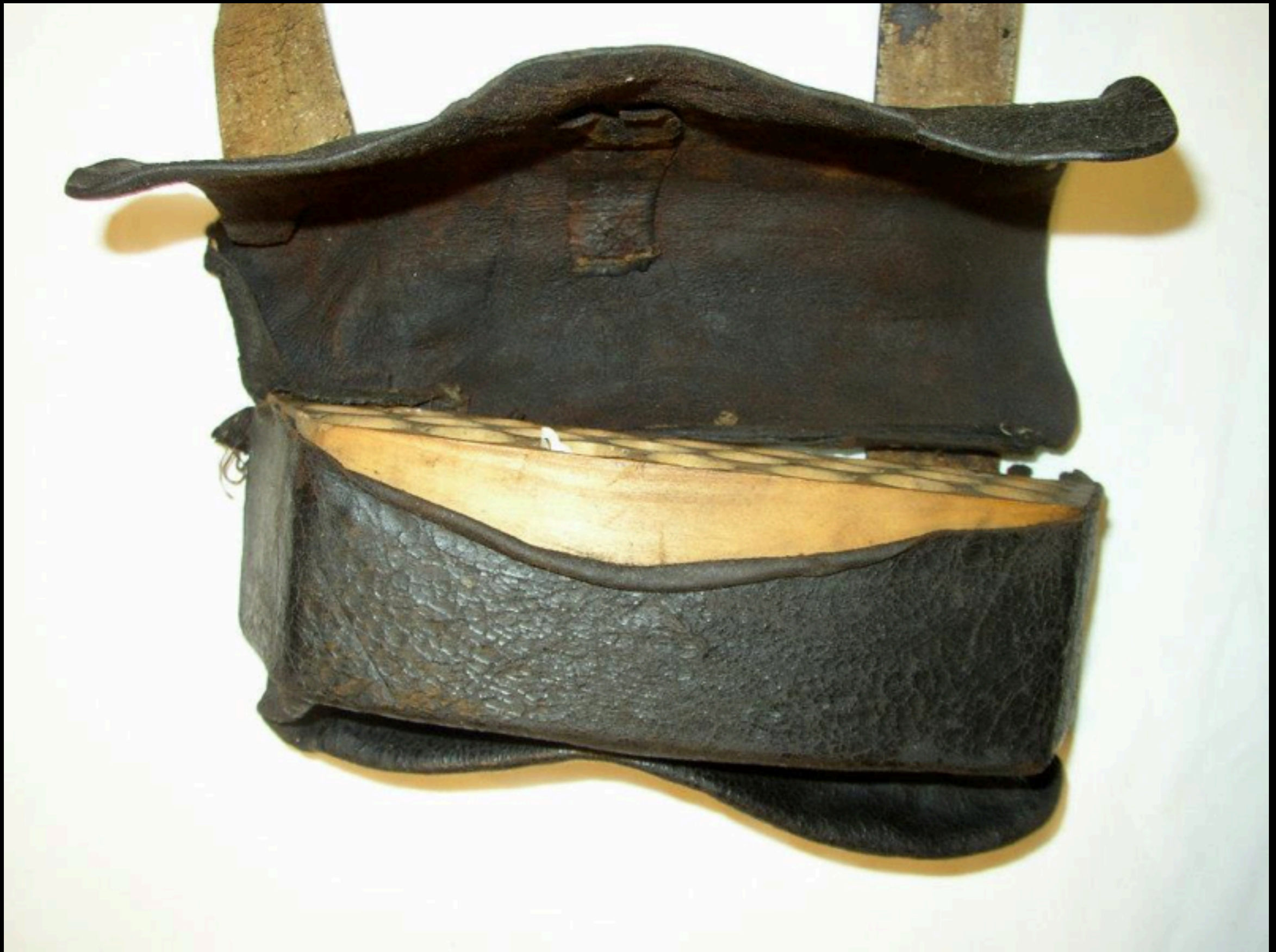
American 24 Round Cartridge Pouch 18th Century (Private Collection)