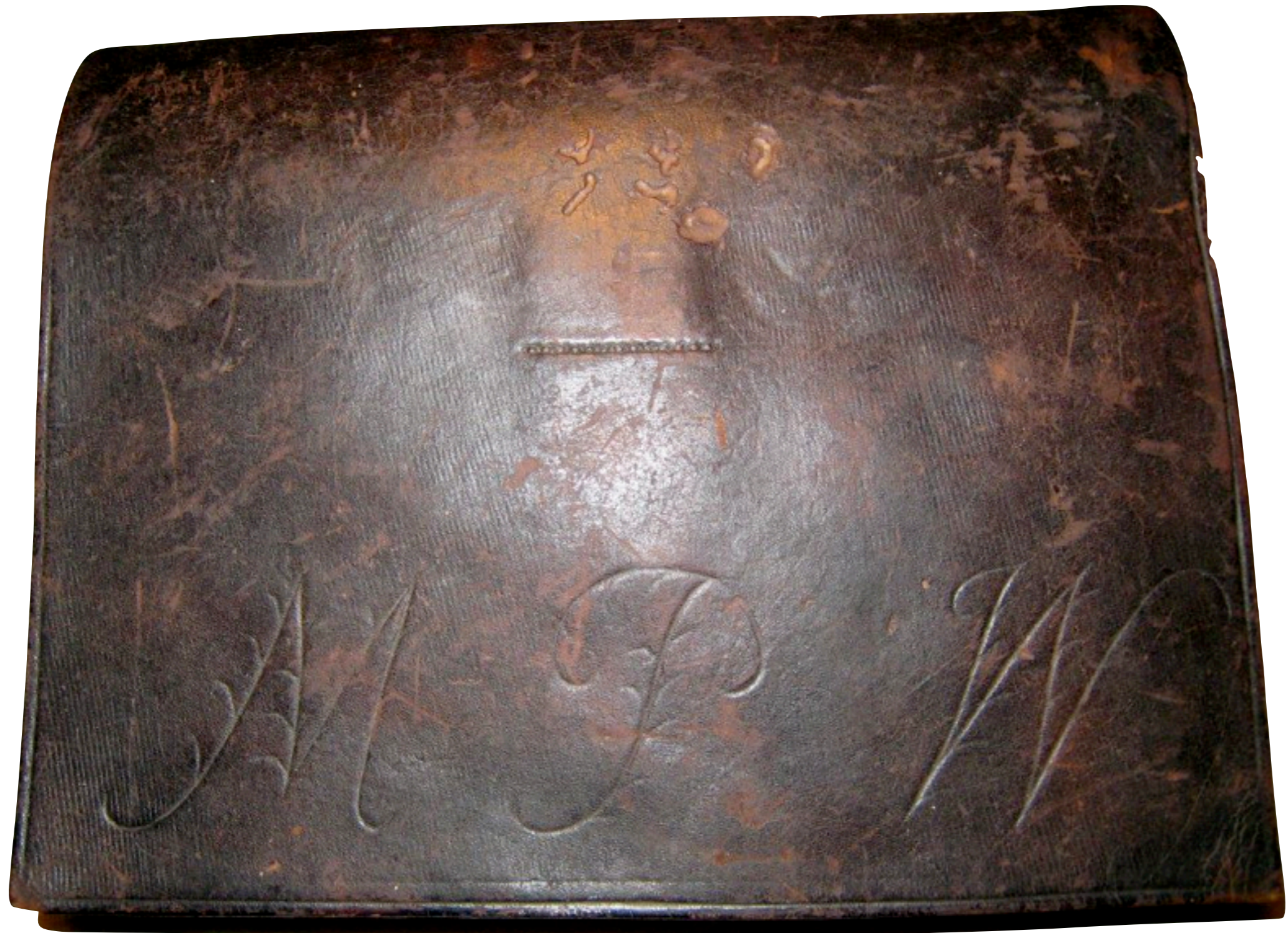
American 24 Round Cartridge Pouch Inscribed "M P W" 18th Century (Private Collection)