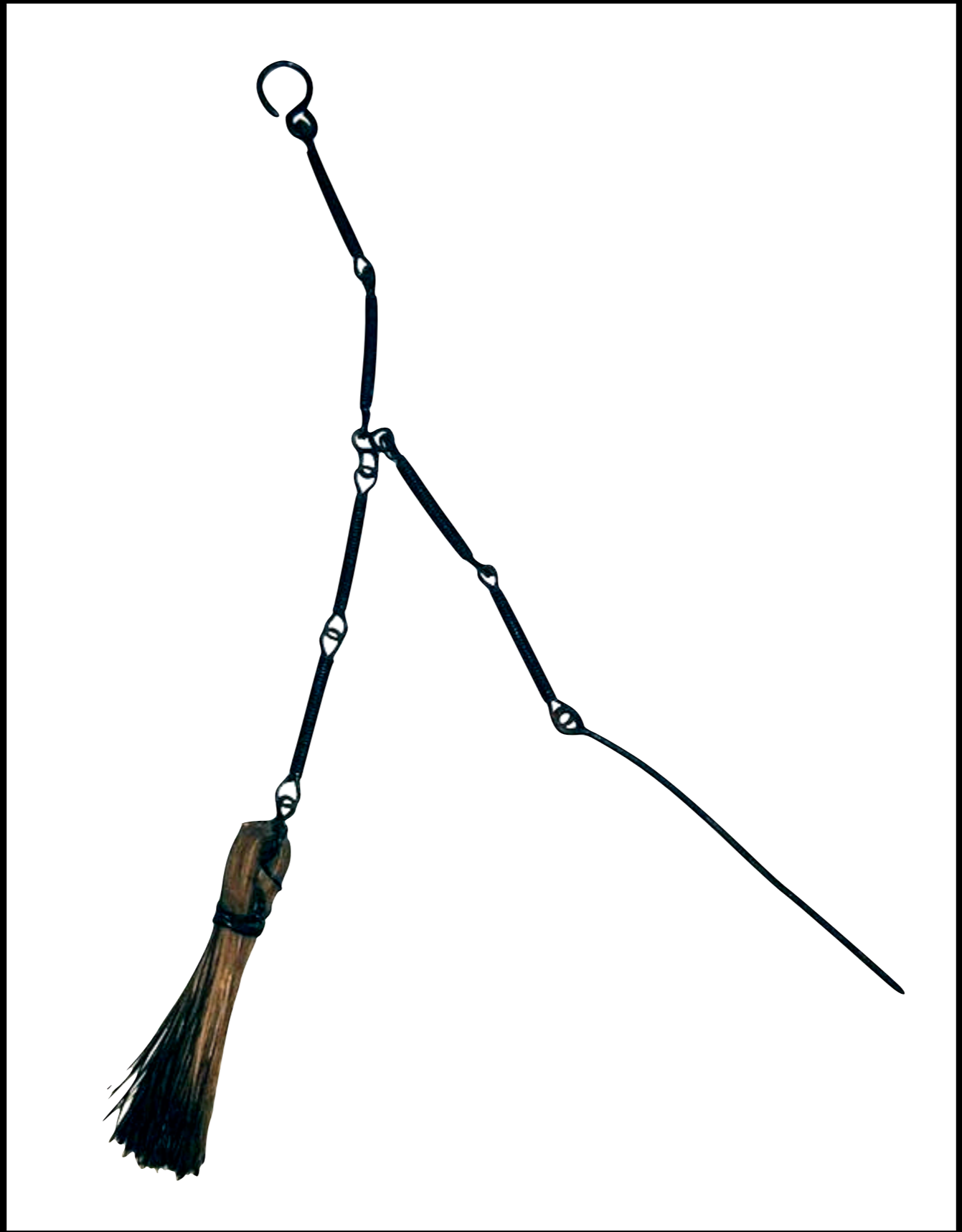
Pick & Straw Whisk 18th Century (Skinner)