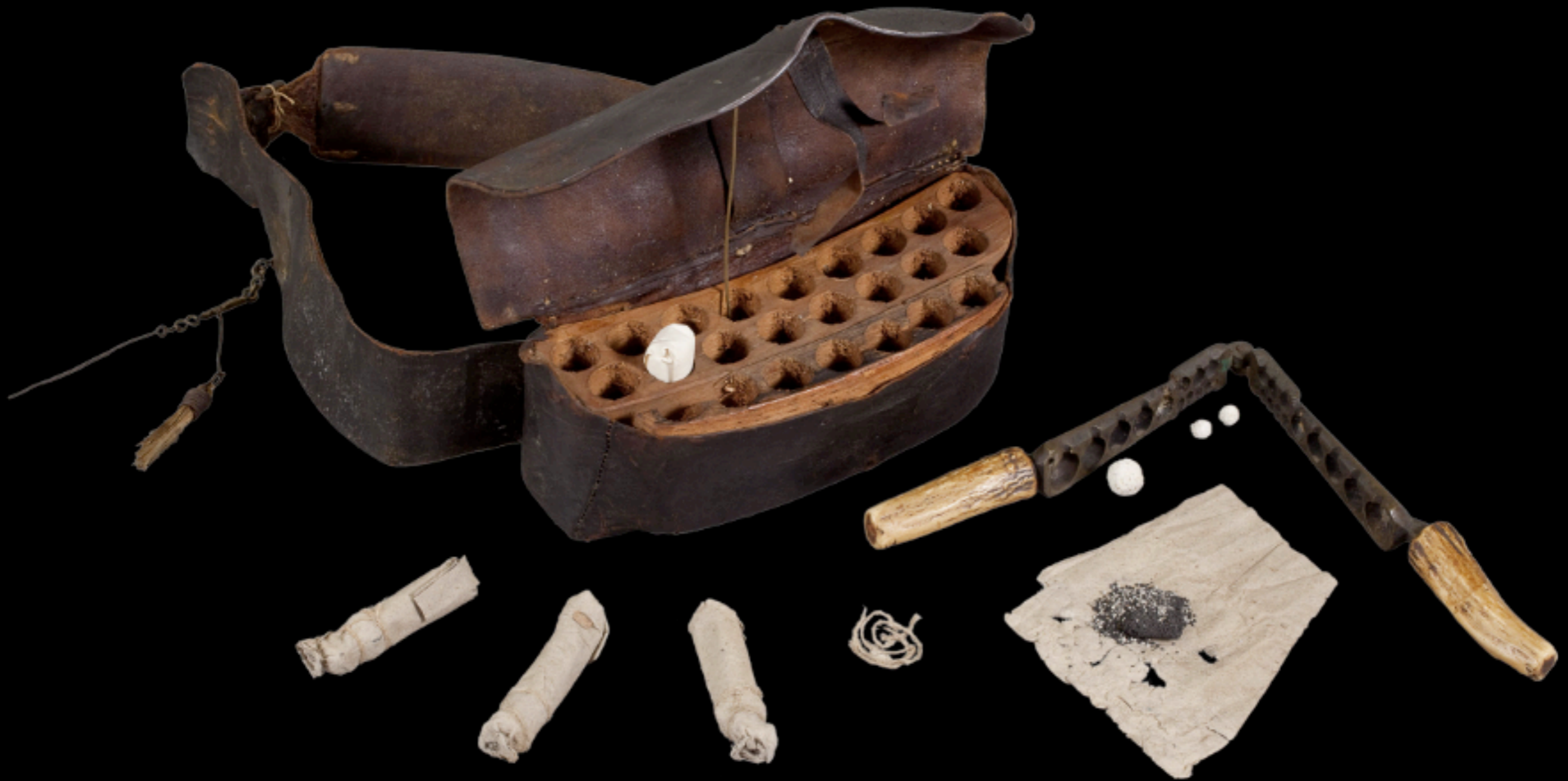
American 17 Round Cartridge Pouch with 7 Round Block Addition Ball Mold & Cartridges (Museum of the American Revolution)