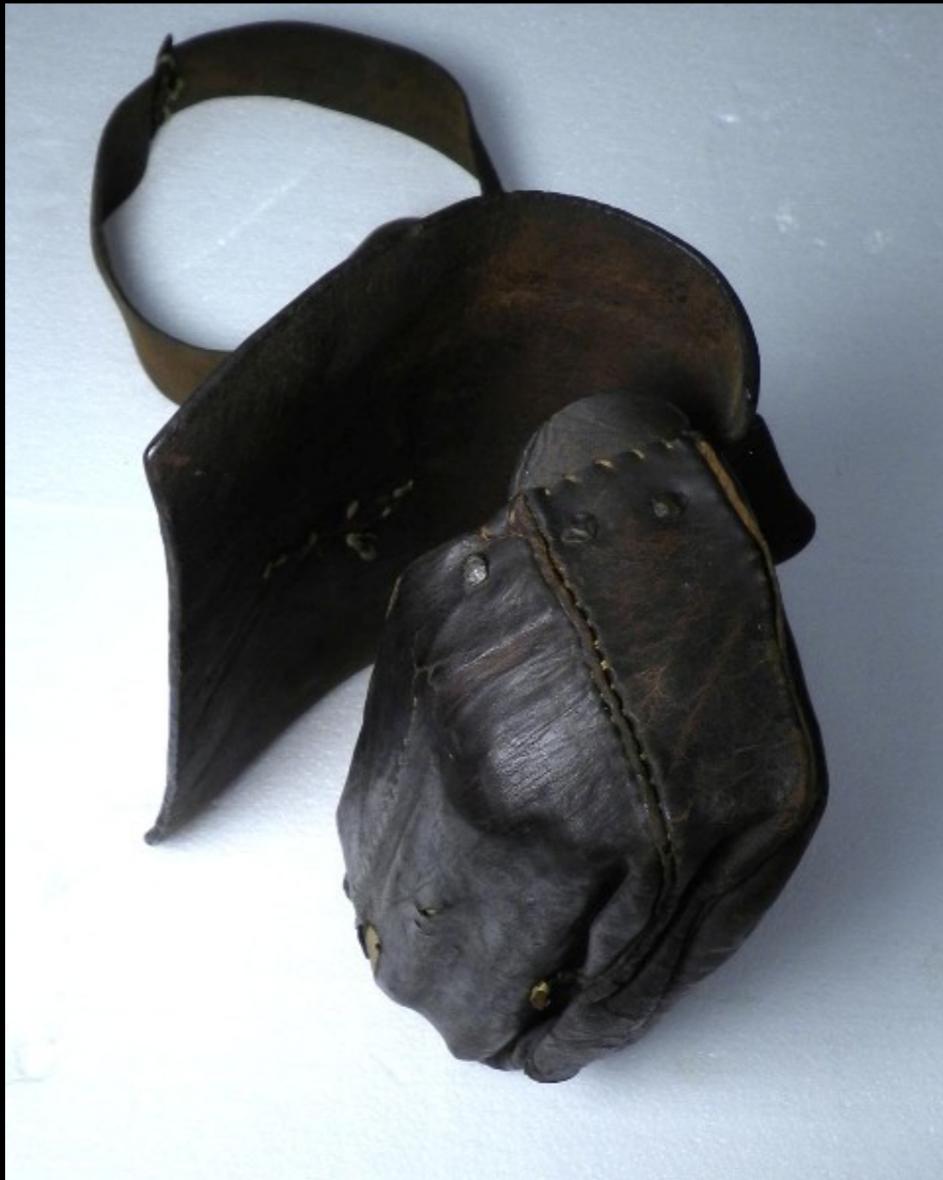
American Cartridge Pouch Mid - Late 18th Century (Fort Ticonderoga)