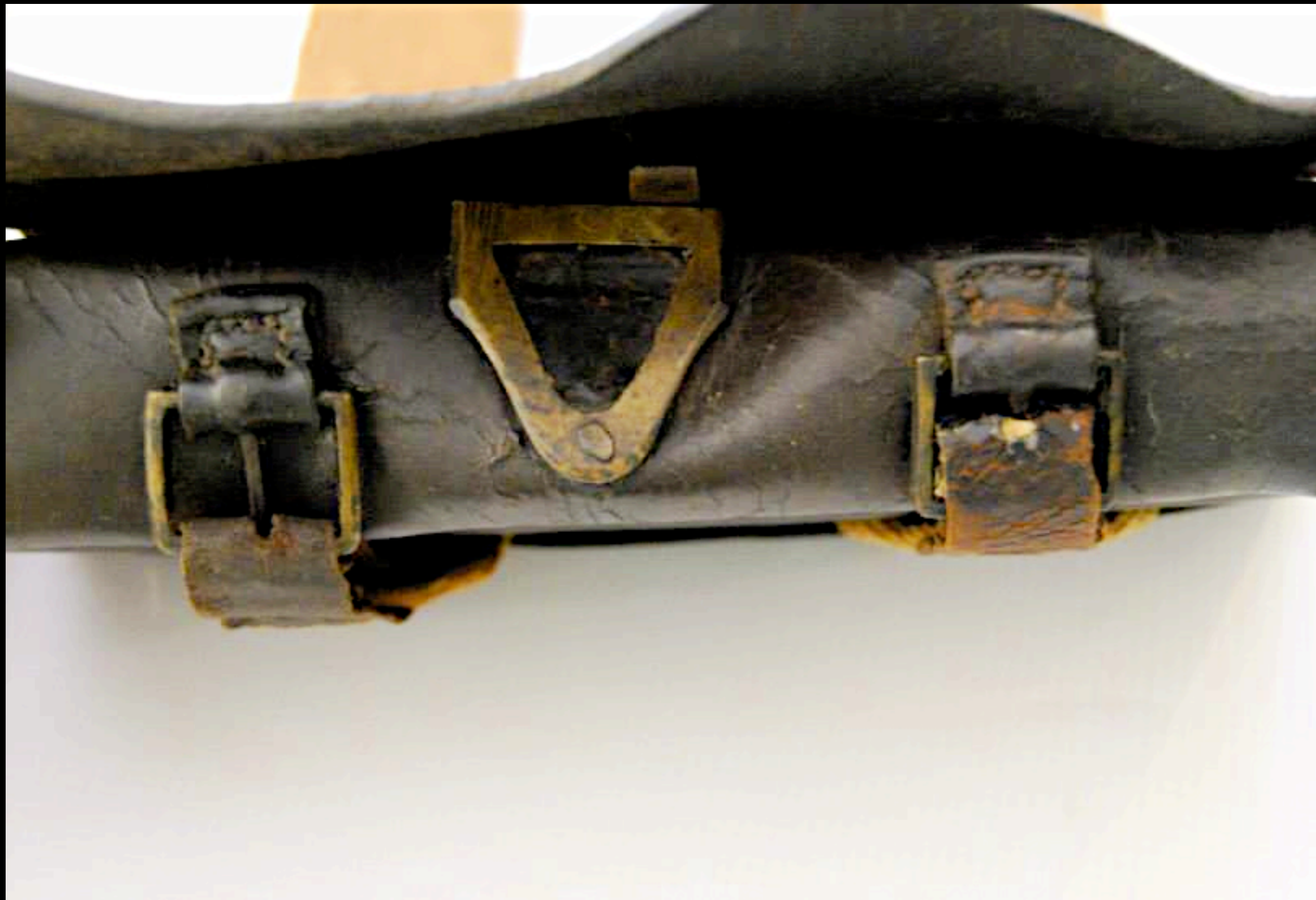
American 20 Round Cartridge Pouch