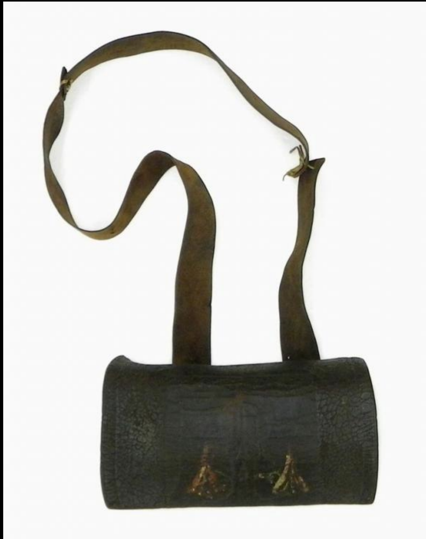
American Cartridge Pouch "THIS IS FAIR LIBERTY" (Fort Ticonderoga)