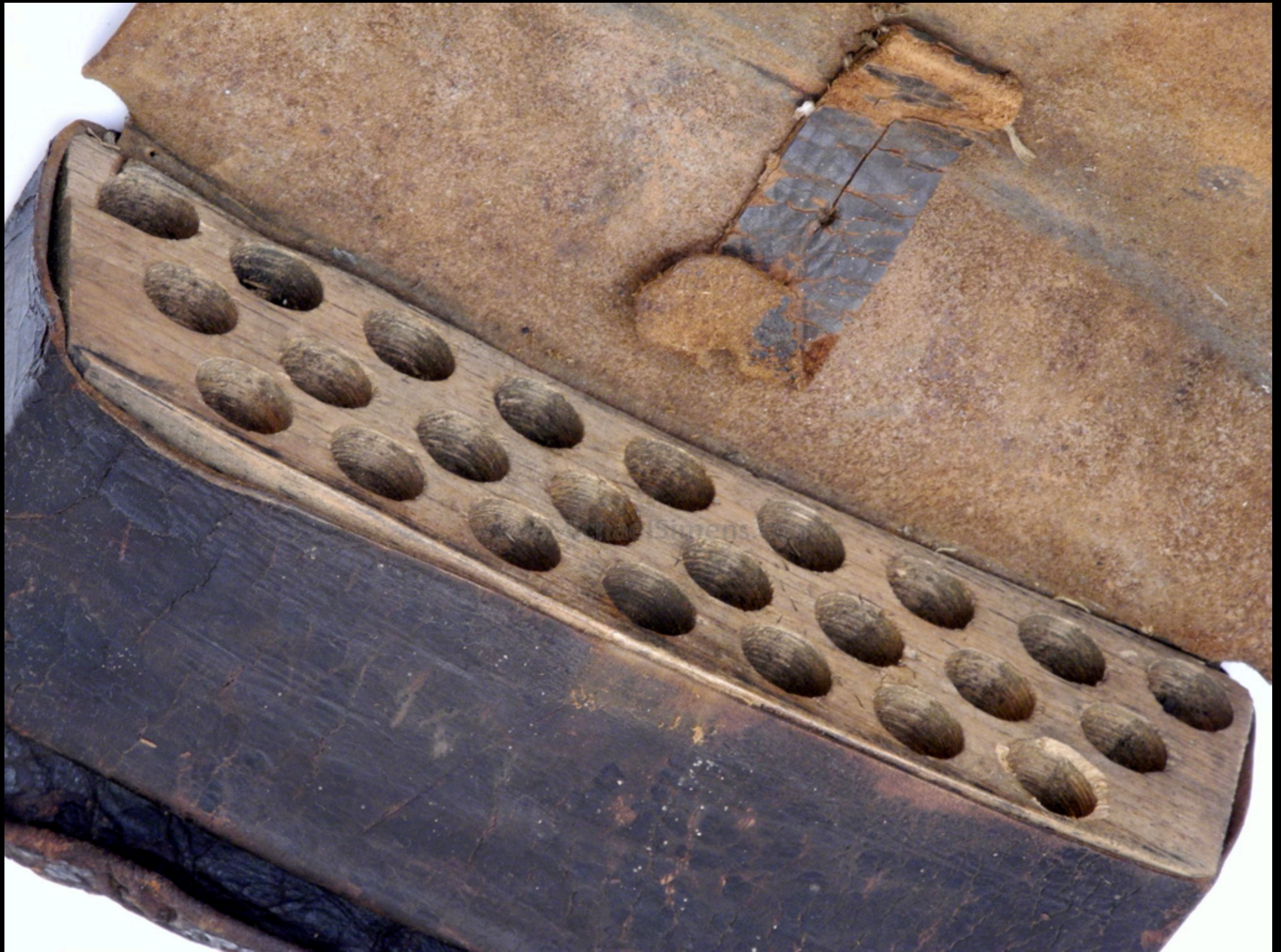
American 24 Round Cartridge Pouch 18th Century