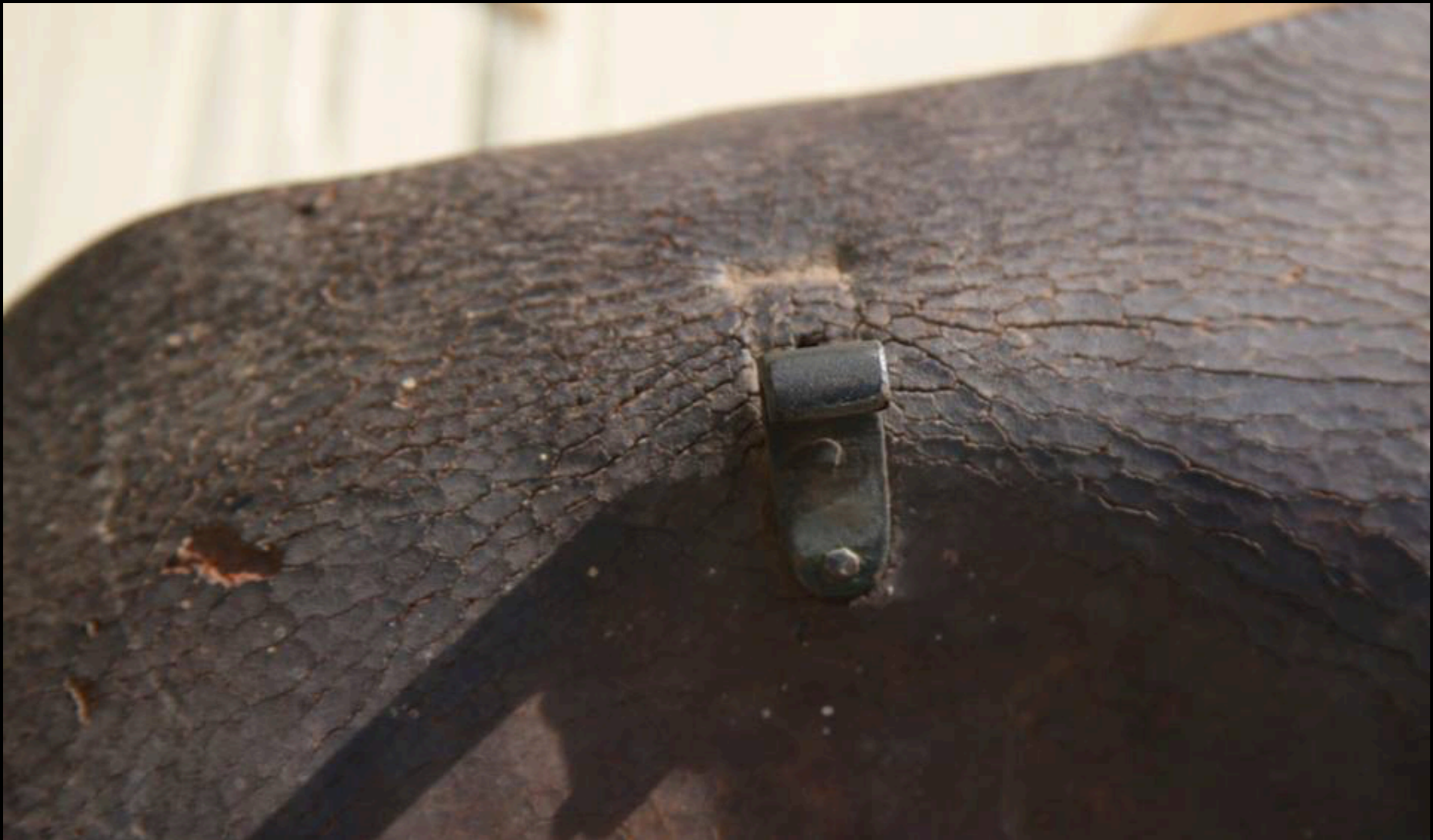
American New Model Cartridge Pouch of 1779 2nd Company - 6th Regiment - Possibly Connecticut (Don Troiani)