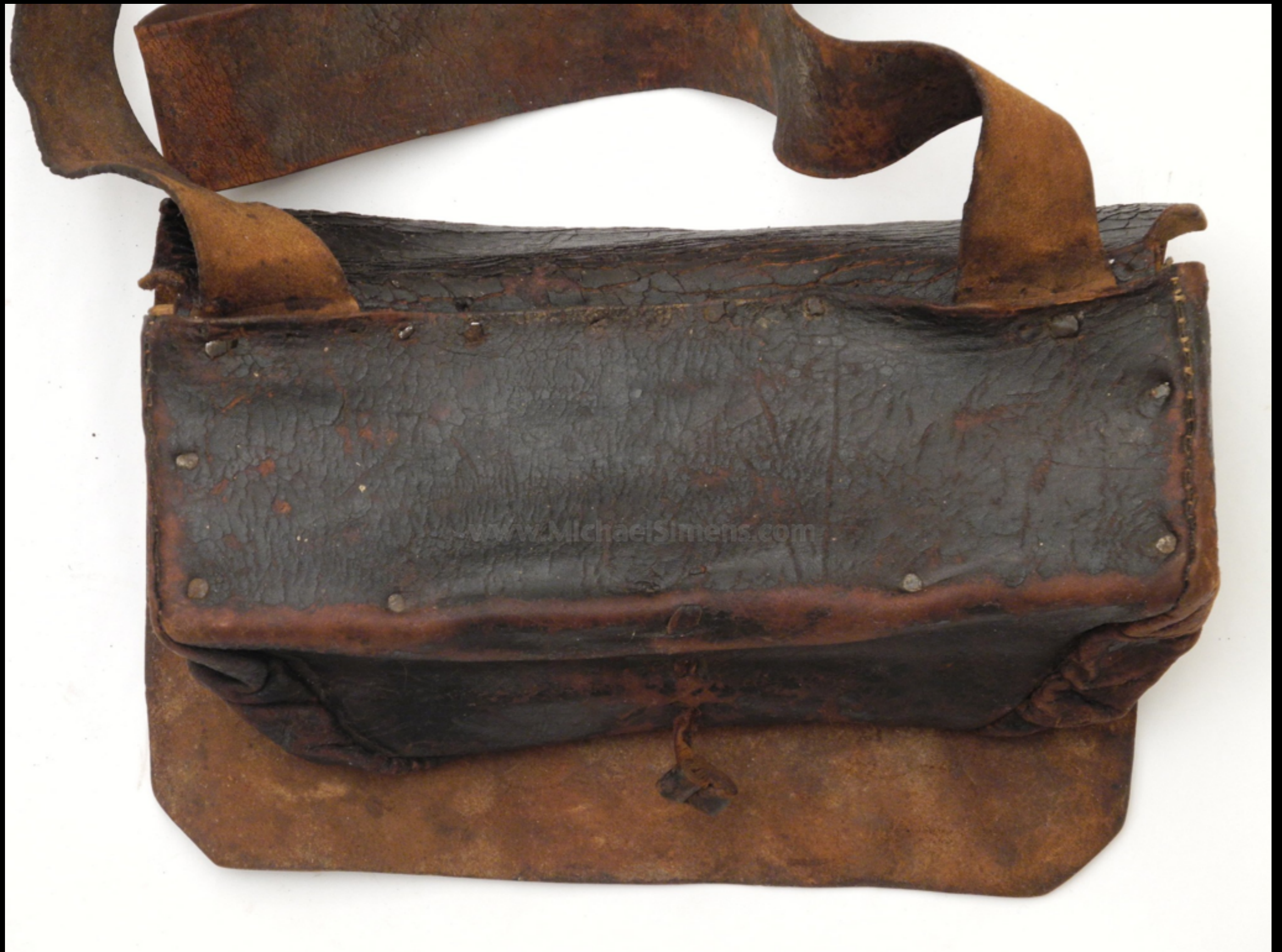
American 24 Round Cartridge Pouch 18th Century