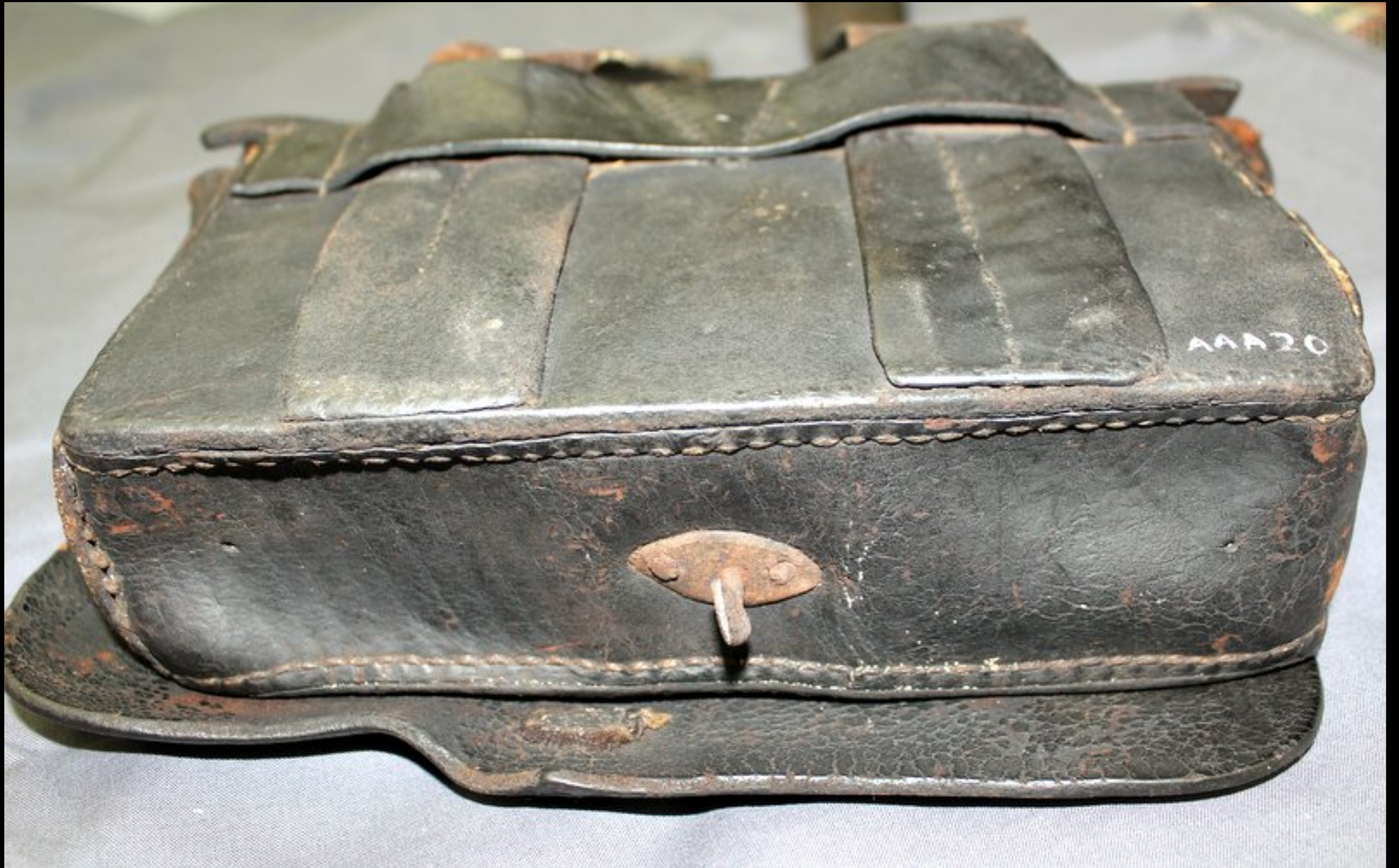
American New Invented Cartridge Pouch Stamped "U. STATES" with "American System" Closure (Don Troiani)