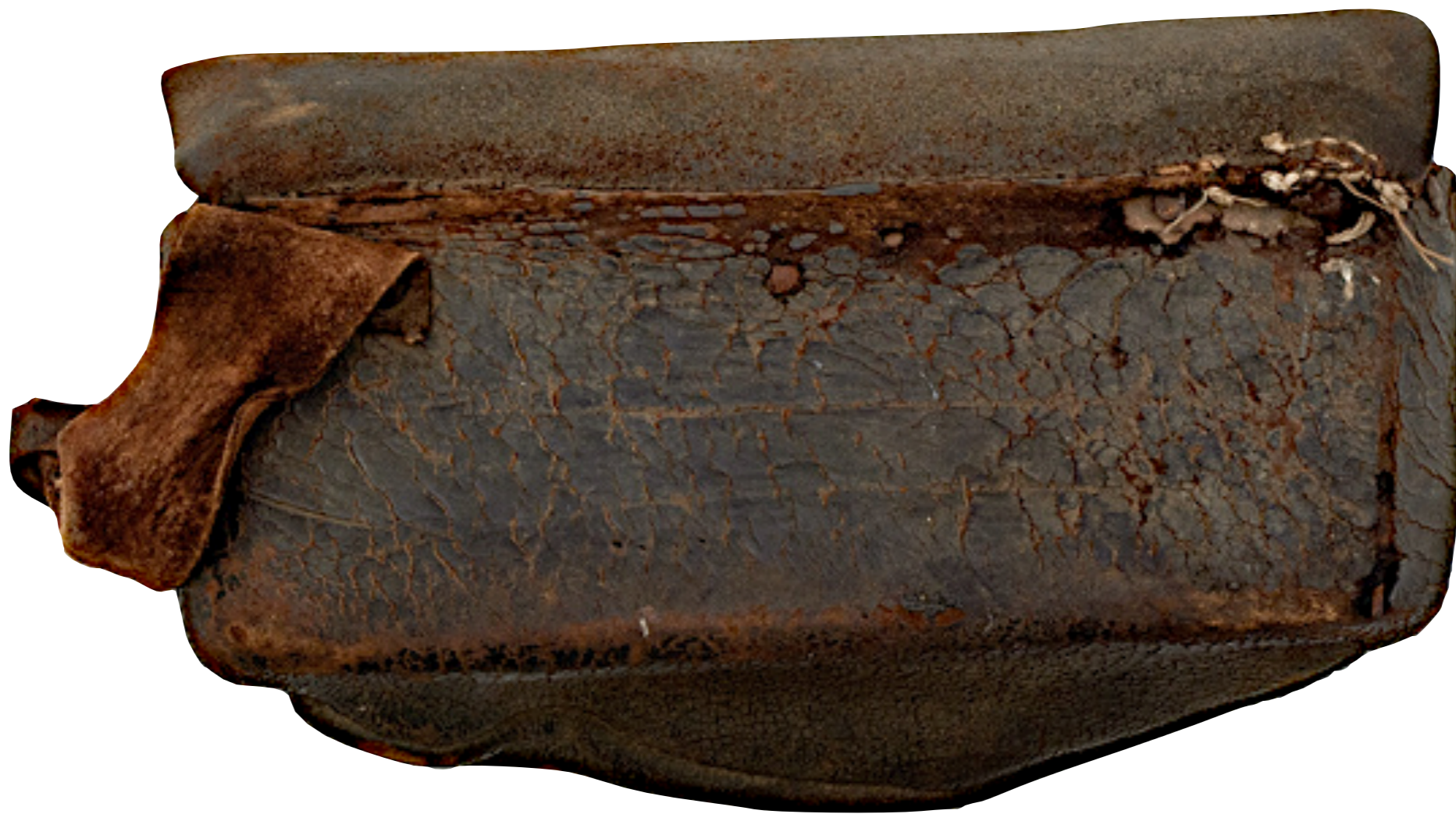
American 24 Round Cartridge Pouch Converted to a Cartridge Box