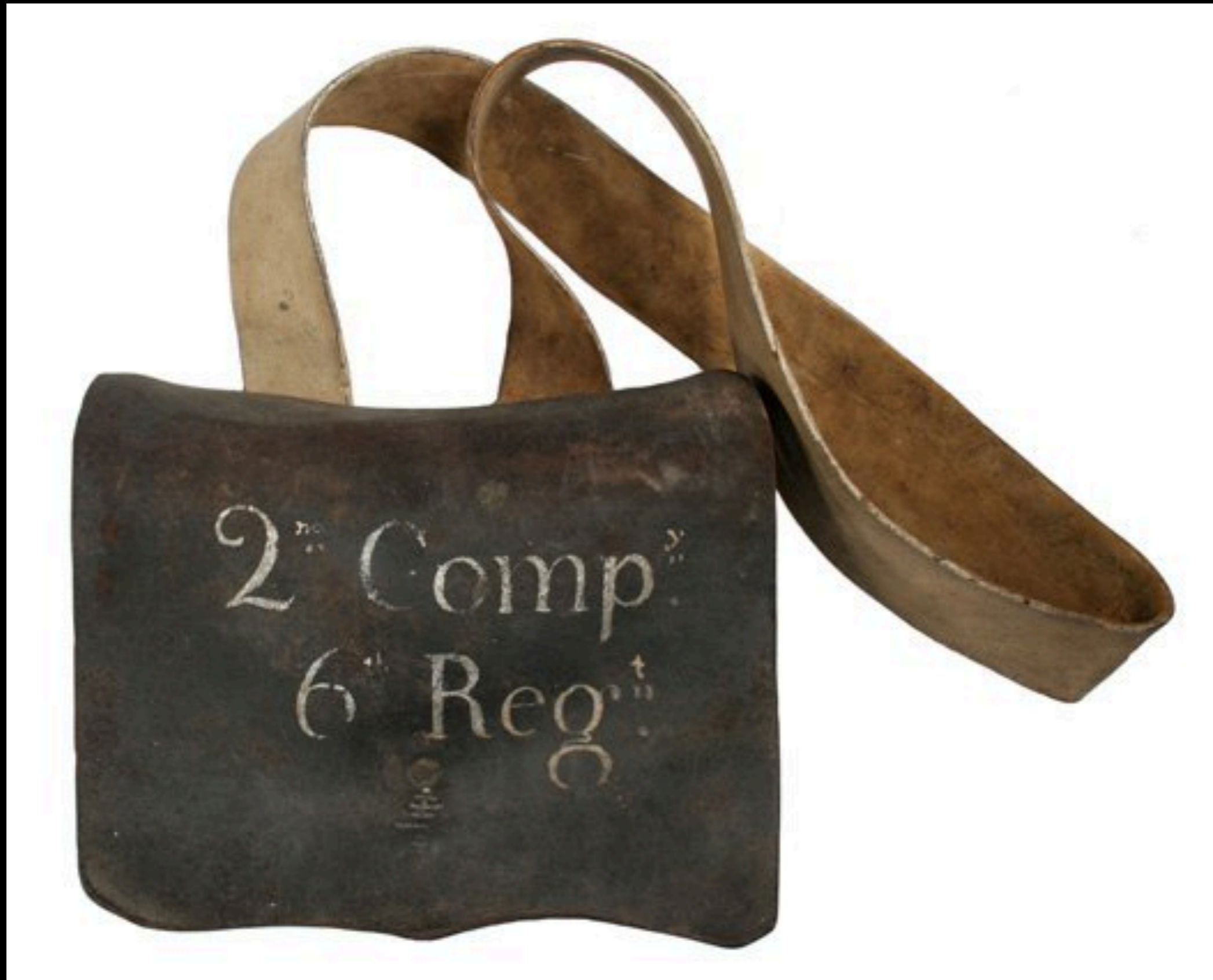
American New Model Cartridge Pouch of 1779 2nd Company - 6th Regiment - Possibly Connecticut (Don Troiani)