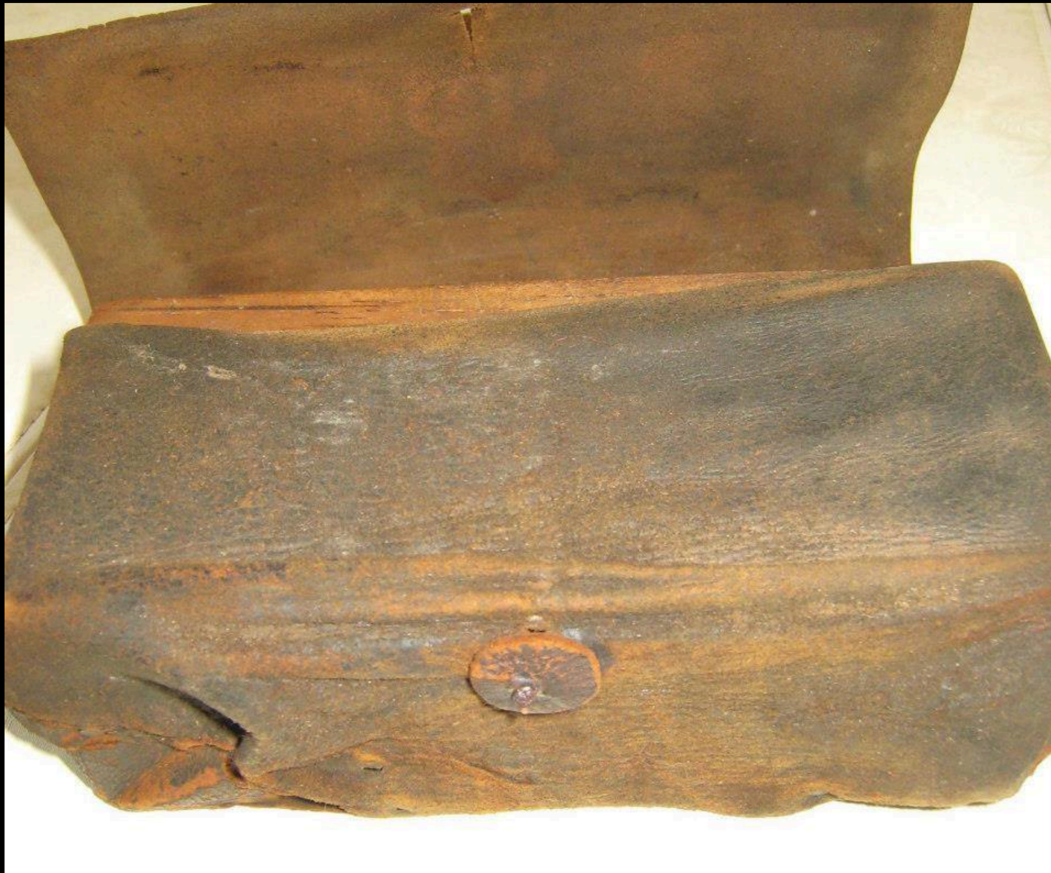
British Cartridge Box Flap with Replacement 24 Hole Block, Soft Bottom, Pouch & Shoulder Straps 18th Century (Private Collection)