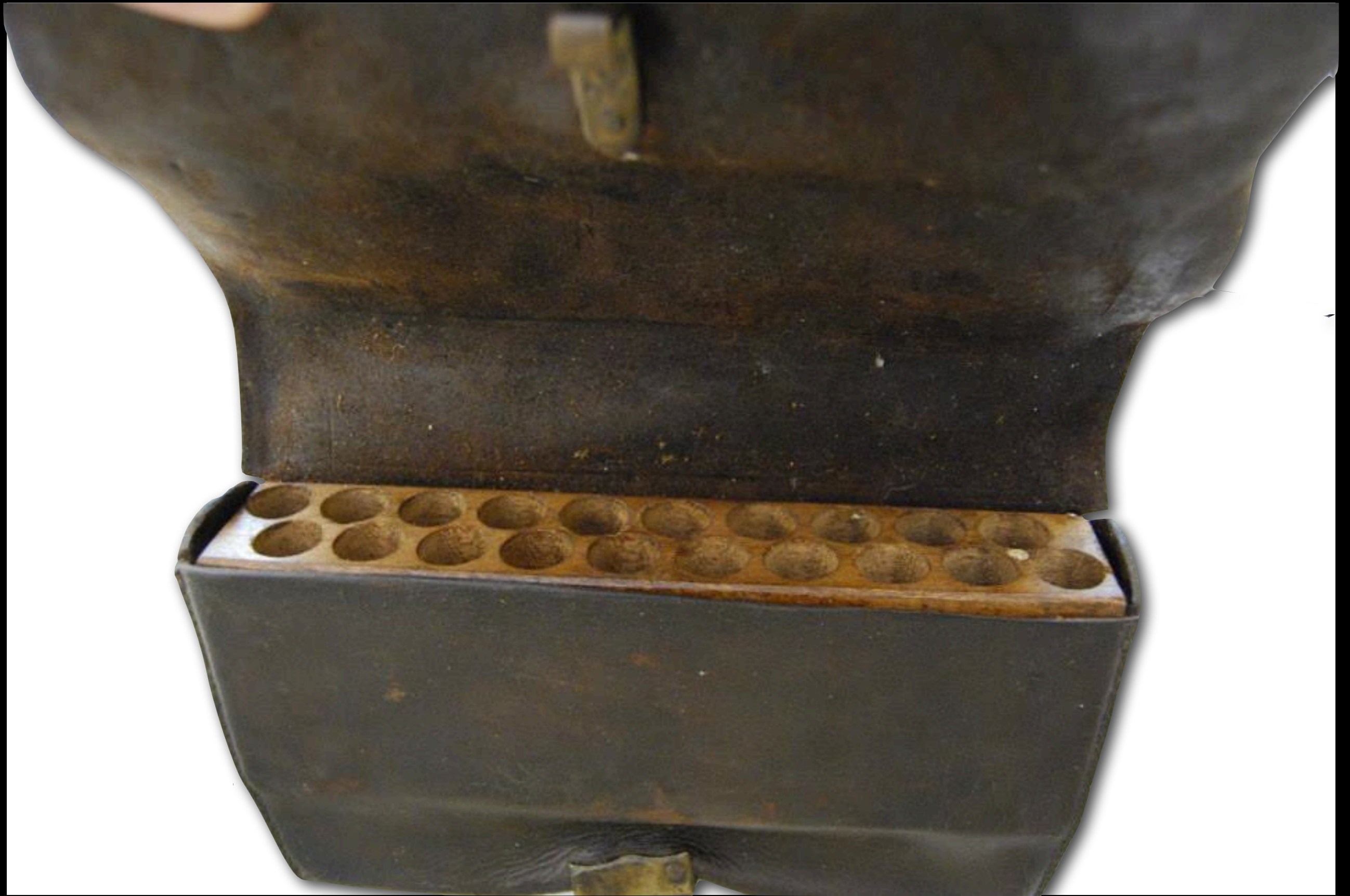
American 20 Round Cartridge Pouch