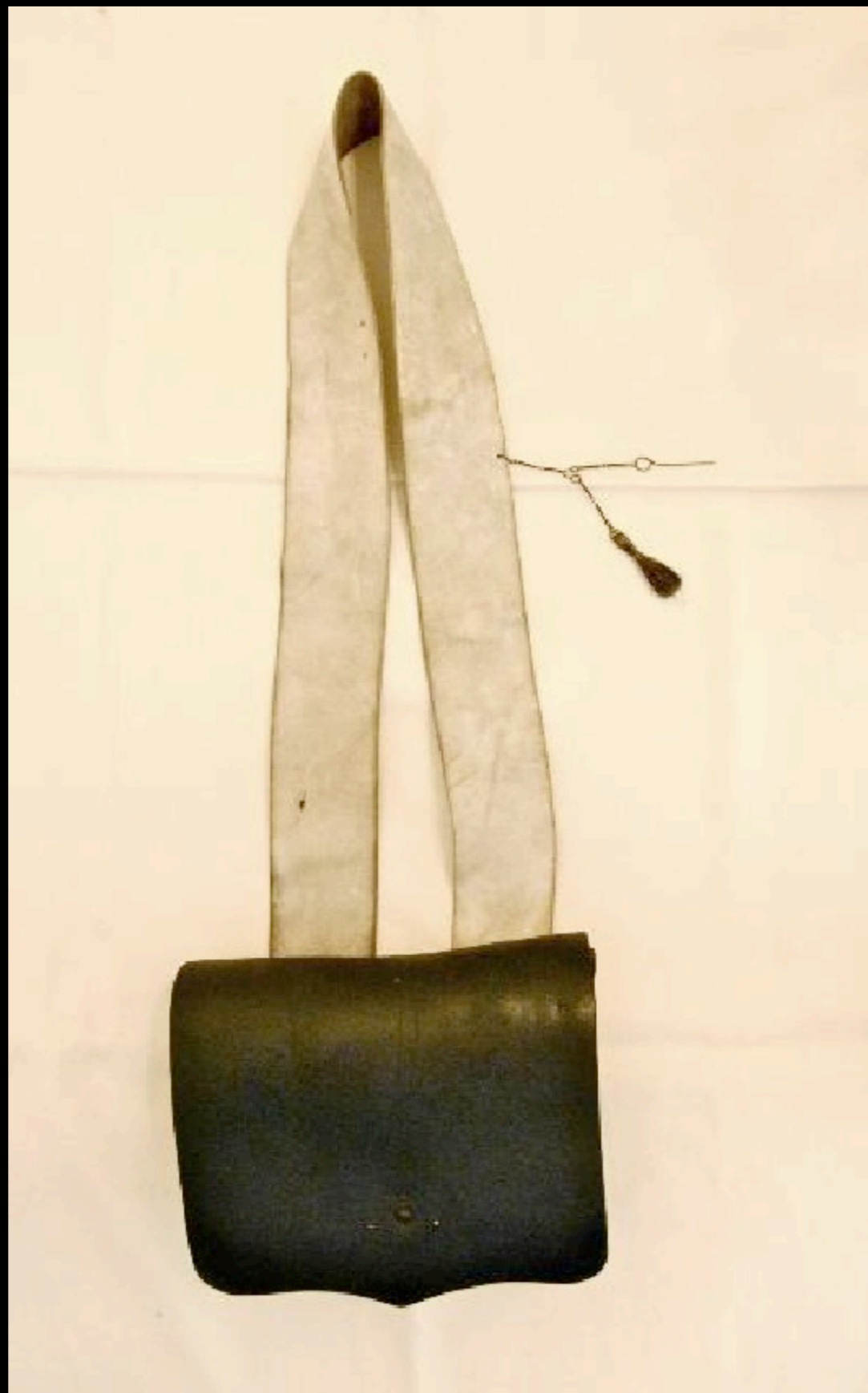
American 29 Round "New Model" Cartridge Pouch 18th Century

(Colonel J. Craig Nannos Collection)