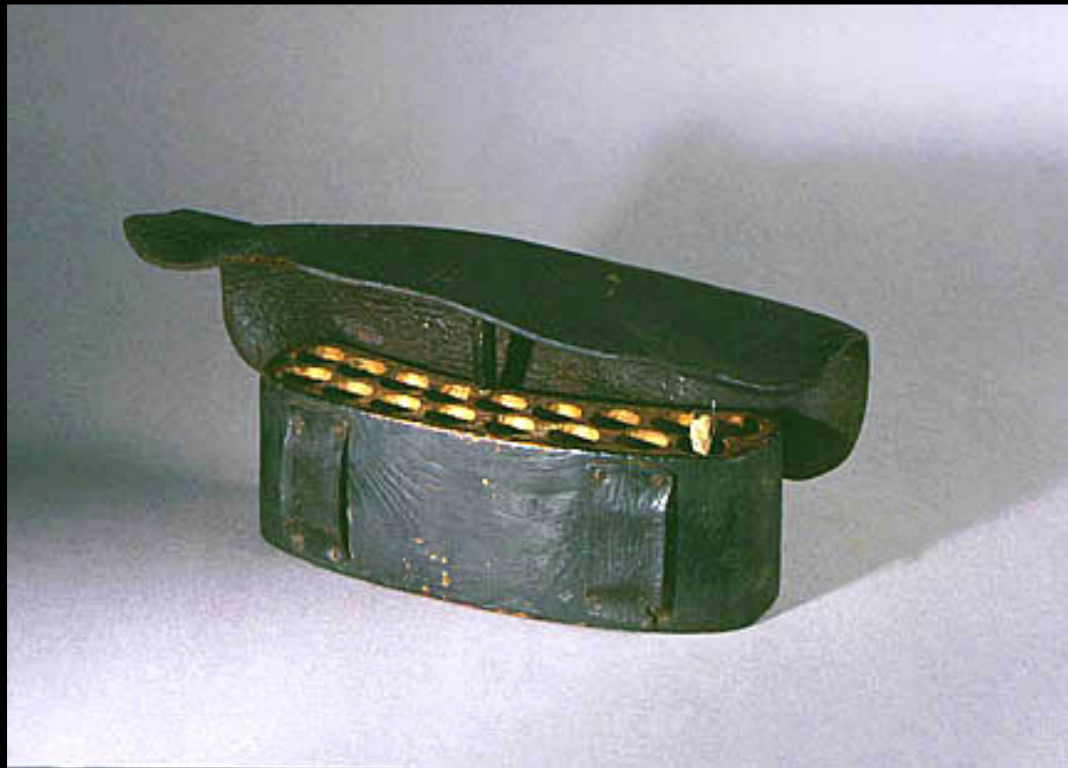
American 17 Round Dragoon Cartridge Box 18th Century (Valley Forge National Historic Park)