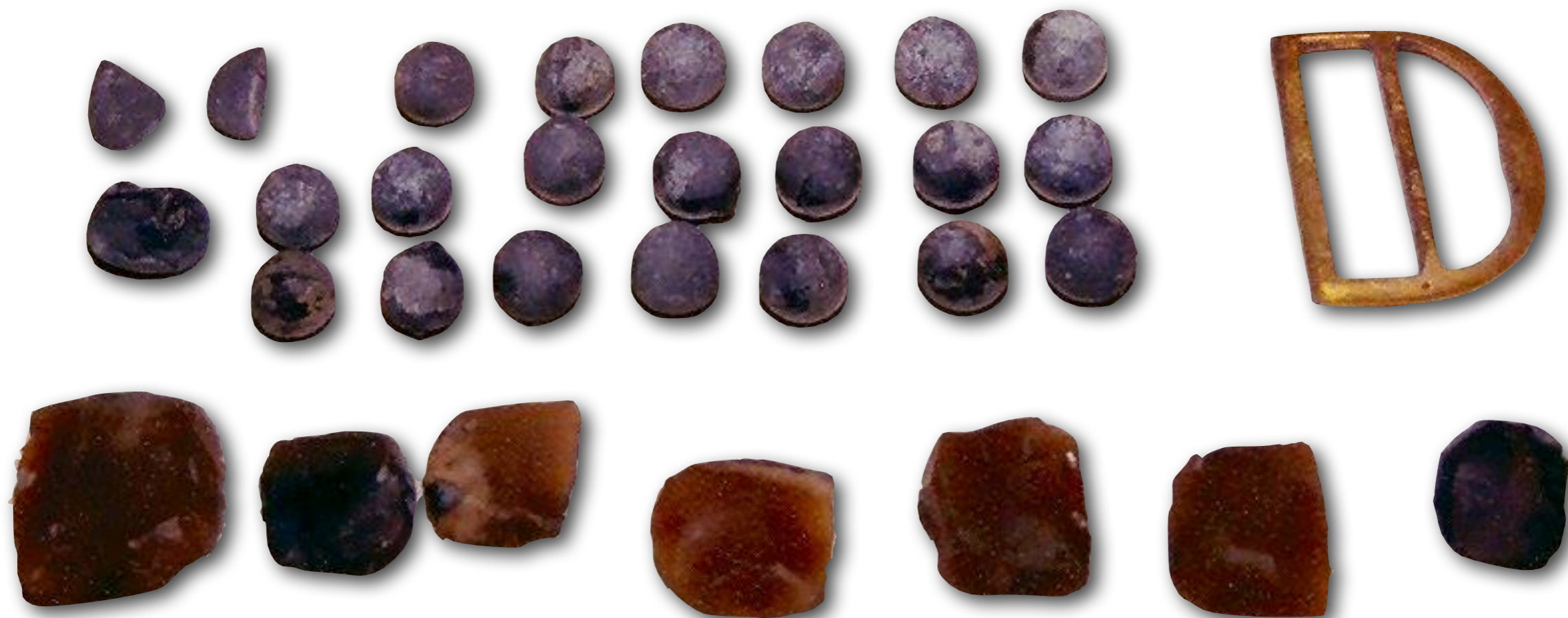
American 19 Round Cartridge Pouch Remnants. Flap Initialed "GMB" Found in Valcour Bay, Lake Champlain c. 1776 (Lake Champlain Maritime Museum - Photos Courtesy Edwin R. Scollon)