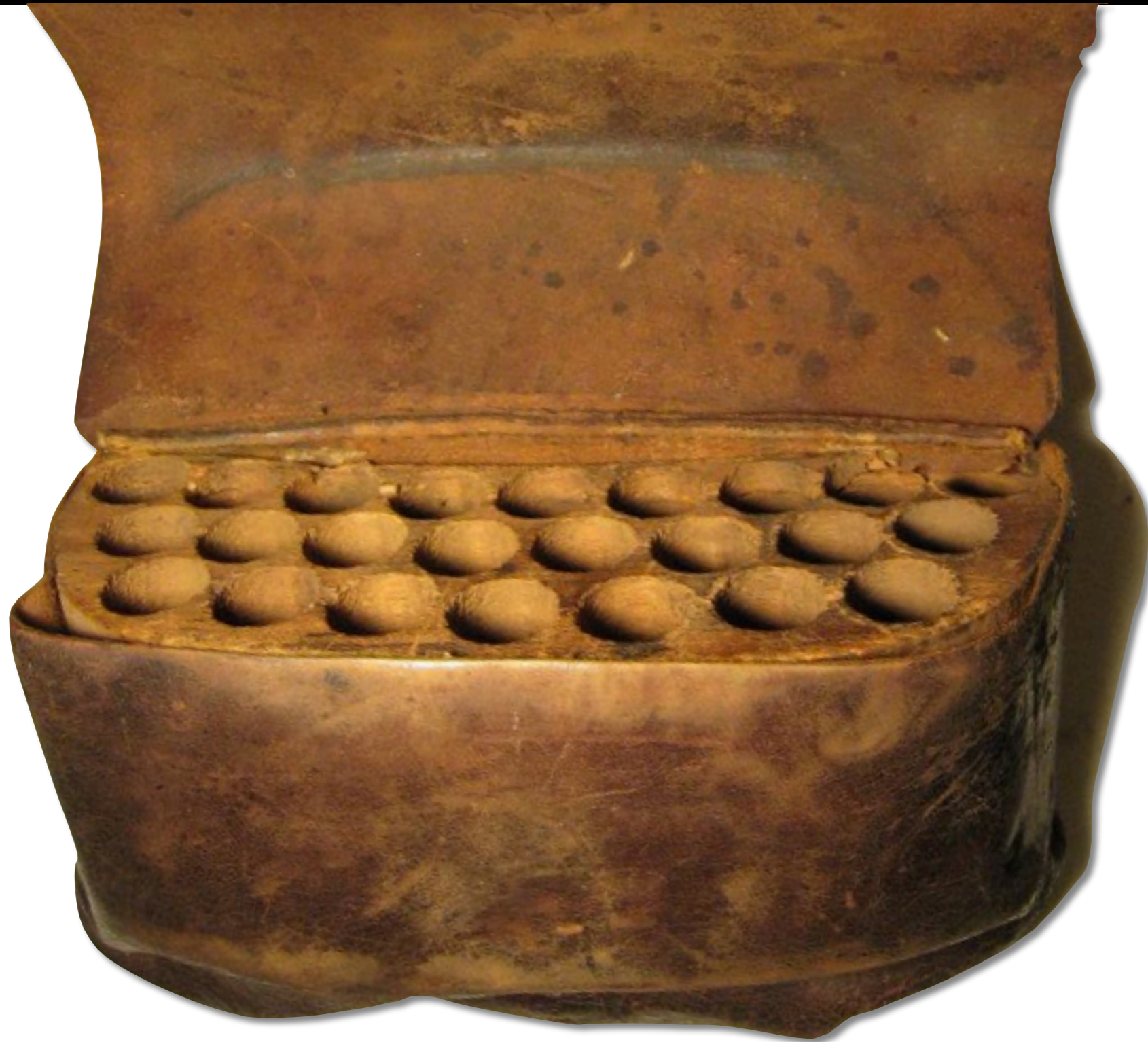
American 24 Round Cartridge Pouch Inscribed "M P W" 18th Century (Private Collection)