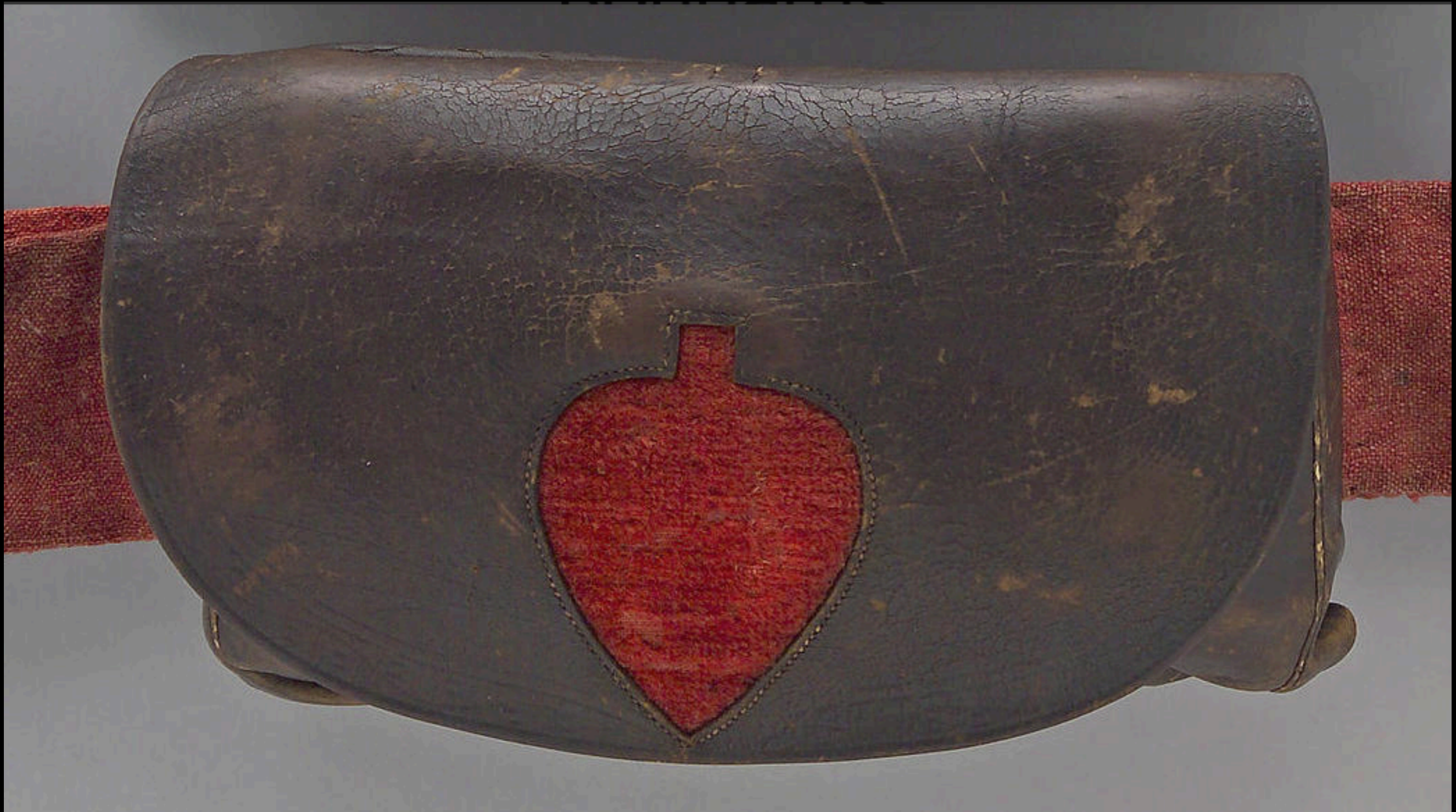
American Cartridge Box with Cloth Covered Waistbelt 18th Century (Bonhams - William H. Guthman Collection)