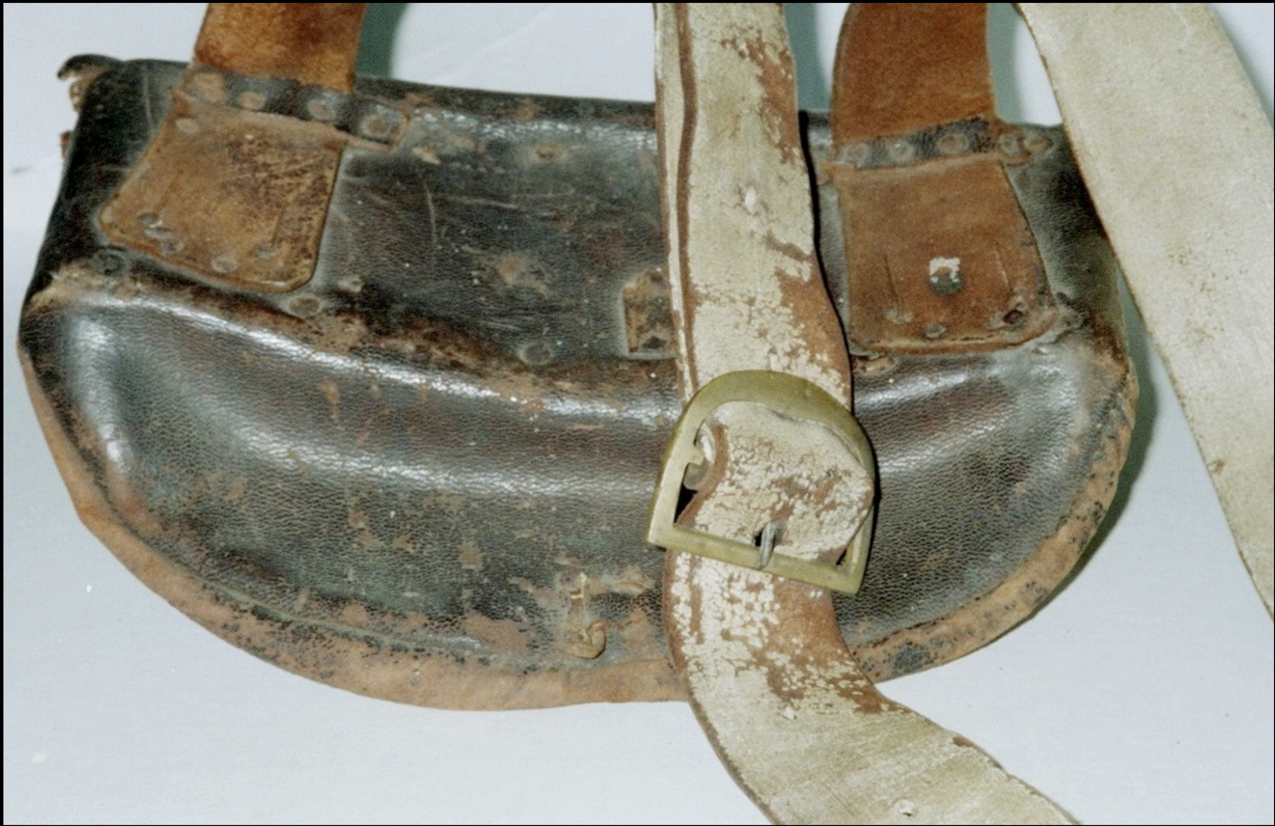
American 17 Round Cartridge Pouch from Massachusetts