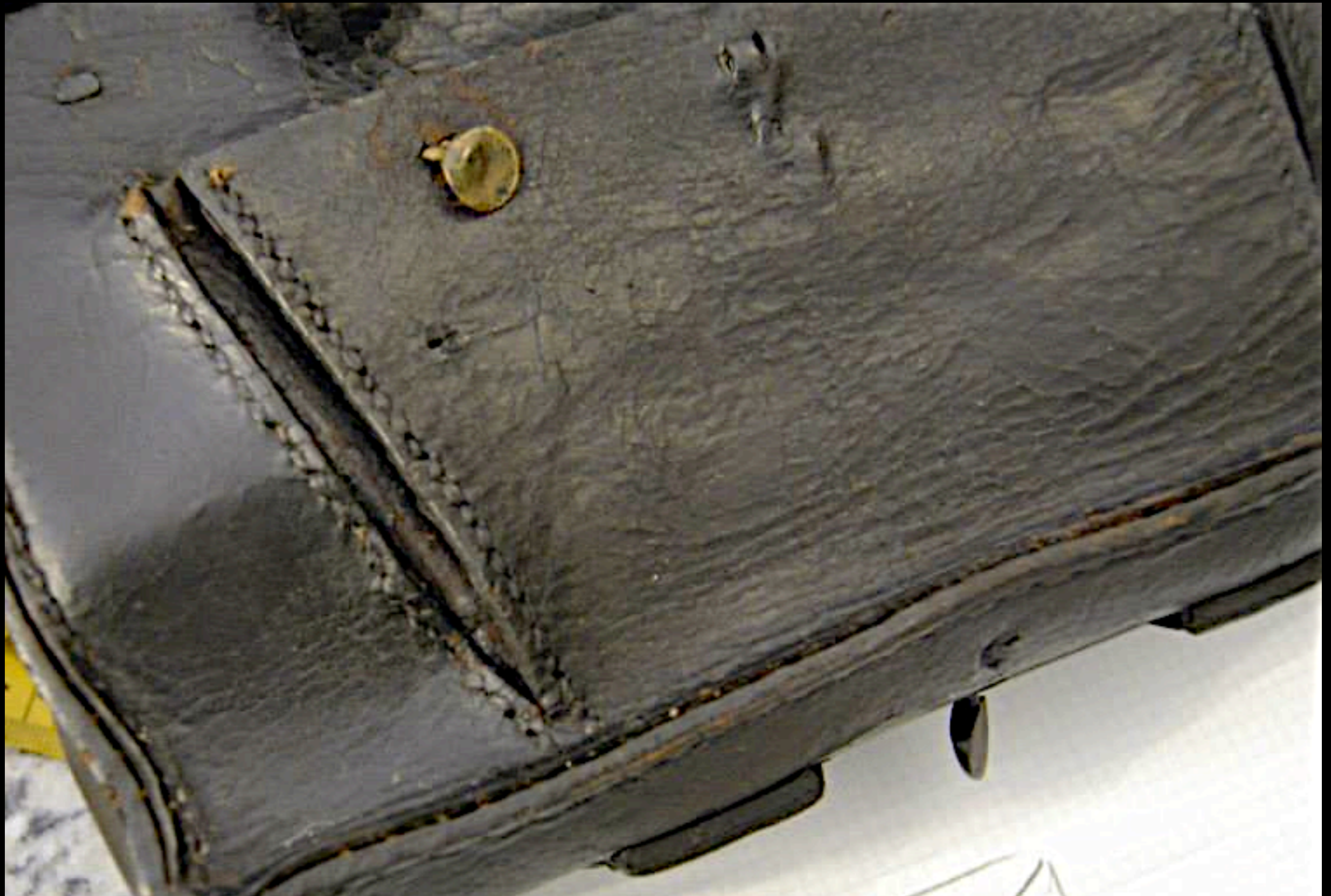
American 29 Round "New Model" Cartridge Pouch 18th Century

(Colonel J. Craig Nannos Collection - Photograph Courtesy Andrew Watson Kirk)