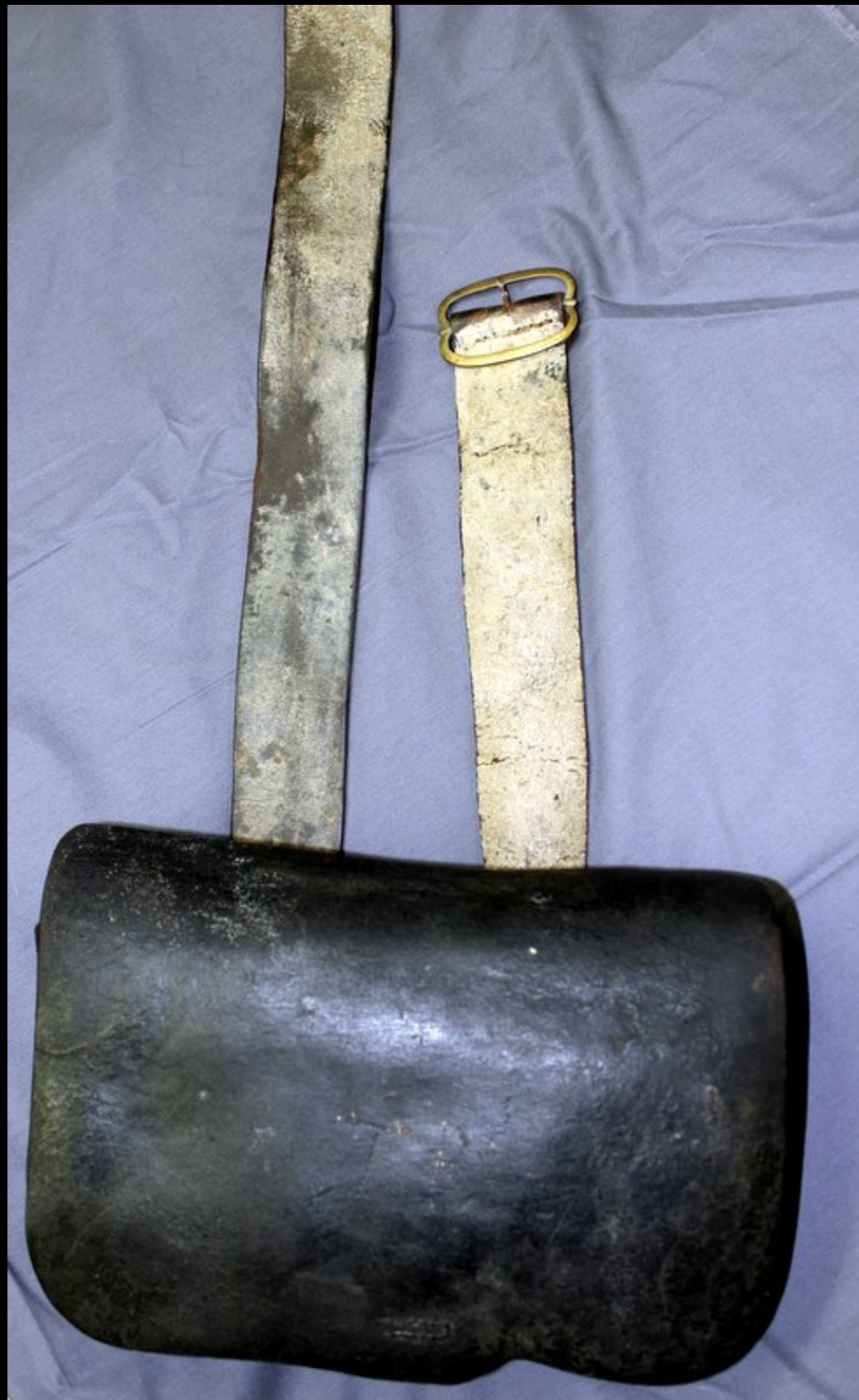
American New Invented Cartridge Pouch Stamped "U. STATES" with "American System" Closure (Don Troiani)