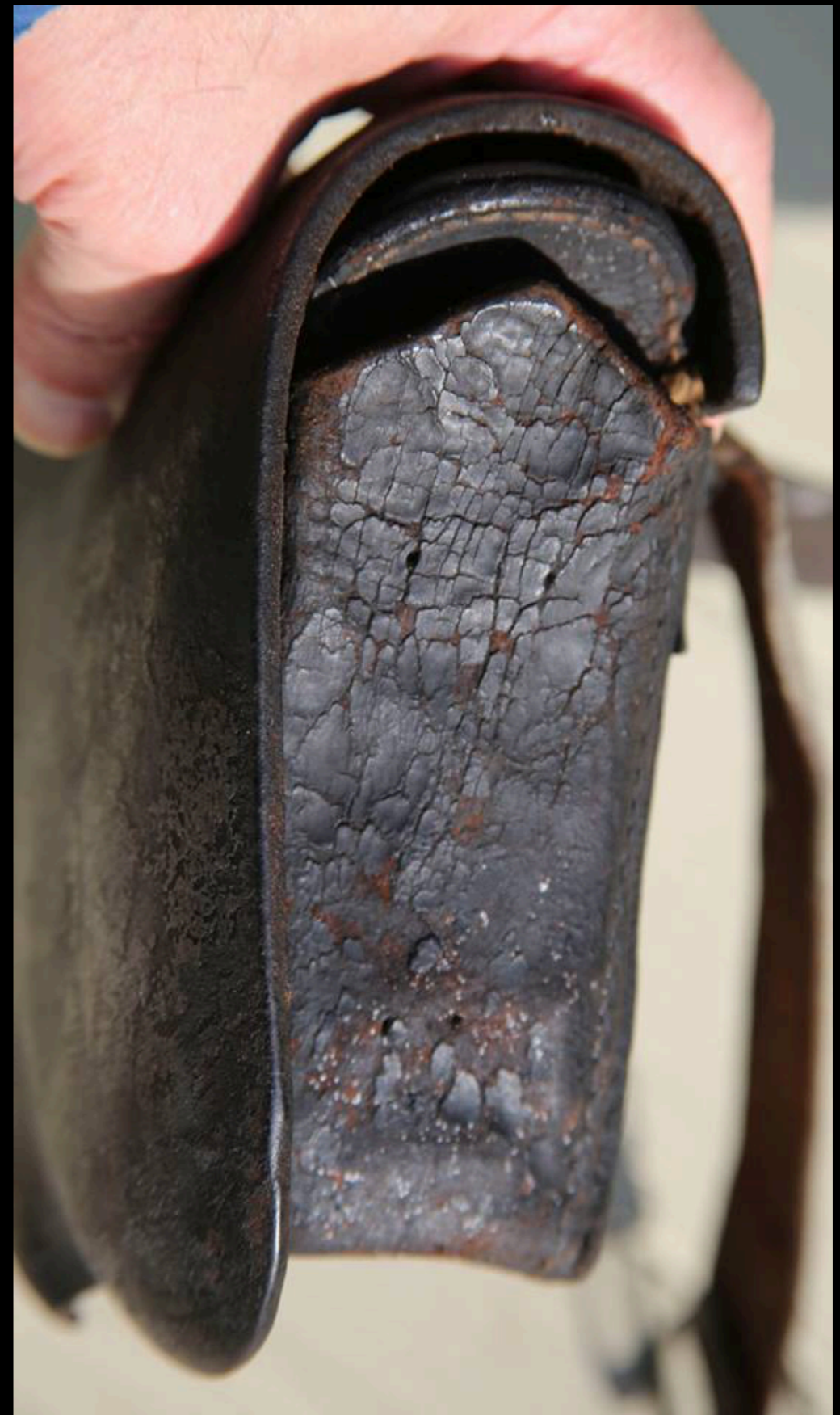
American New Invented Cartridge Pouch Stamped "U. STATES" with "American System" Closure (Don Troiani)