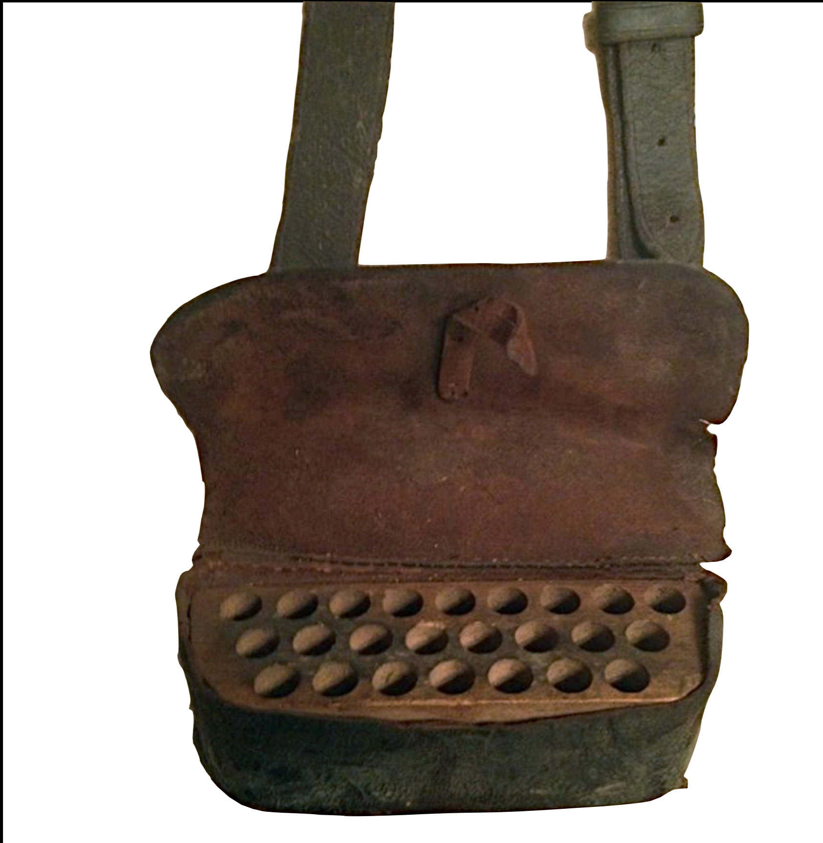
American 24 Round Cartridge Pouch 18th Century (Private Collection)