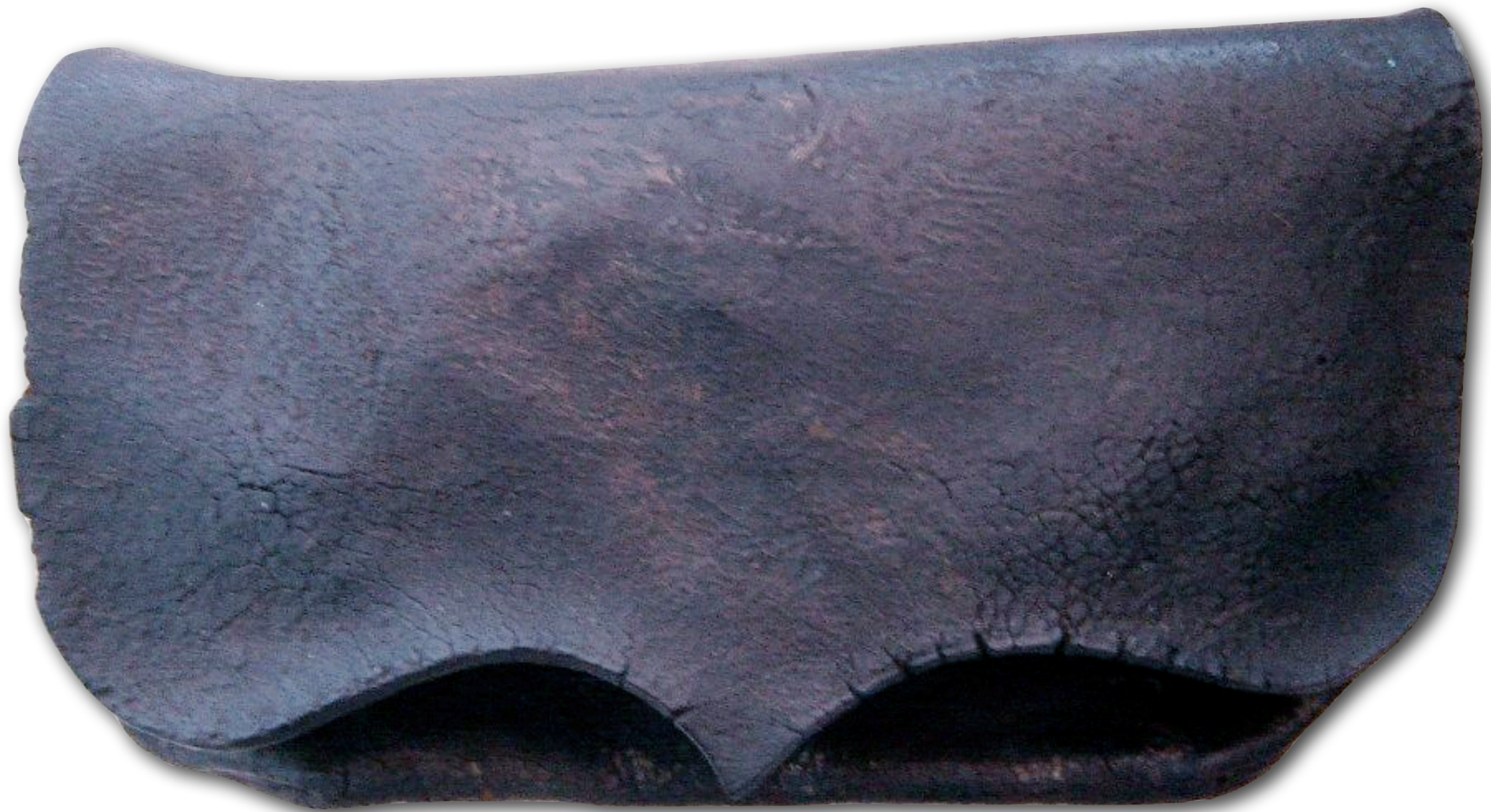
American 30 Round Cartridge Pouch 18th Century

(Colonel Craig J. Nannos Collection - Photograph Courtesy Andrew Watson Kirk)