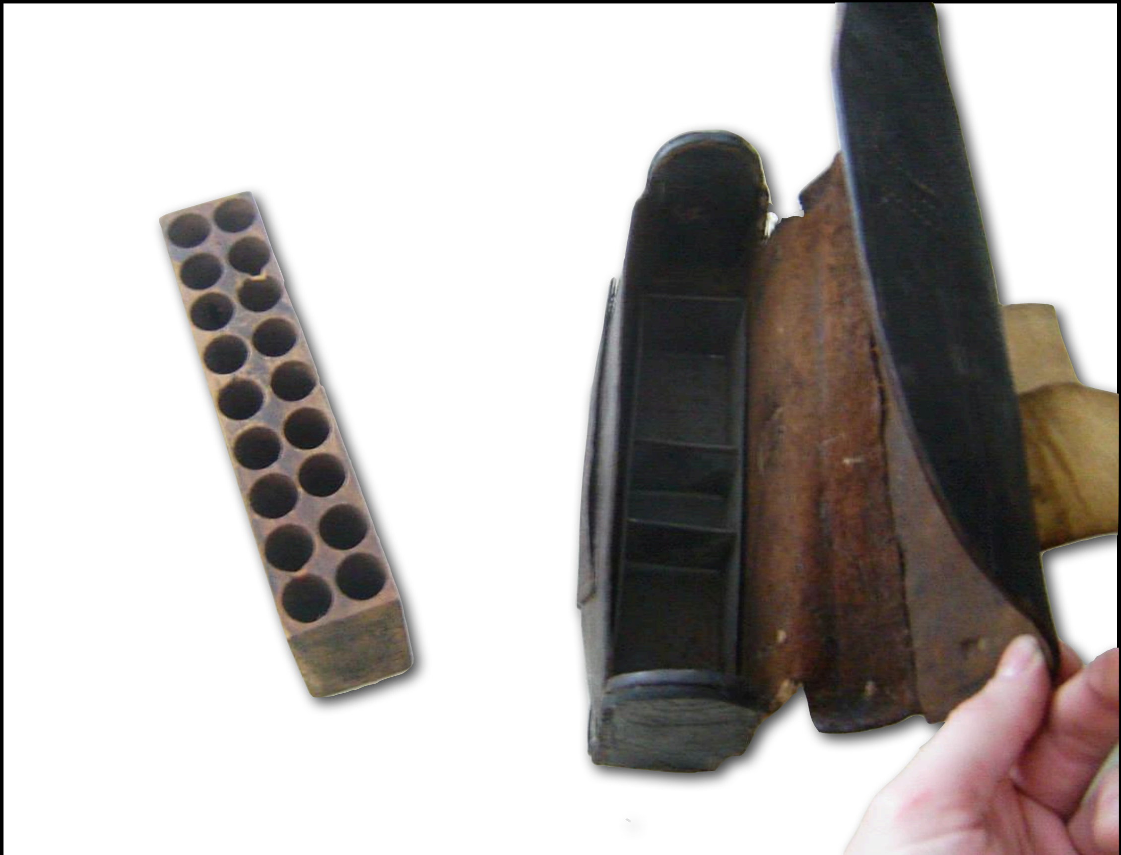
American 18 Round Modified British Light Infantry - Sergeants Pouch with Tin Tray