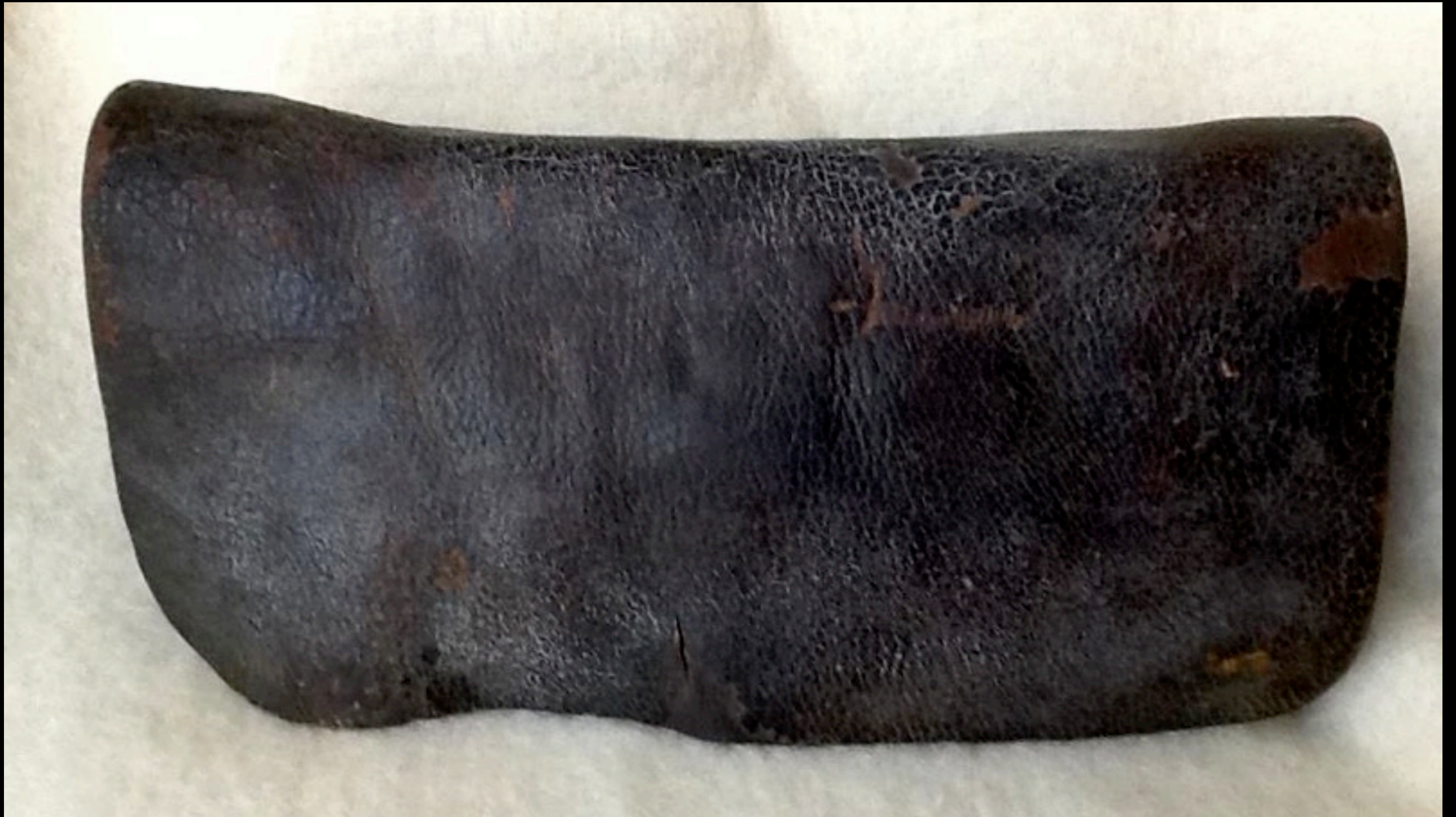
American 17 Round Cartridge Pouch with 7 Round Block Addition 18th Century (Private Collection)