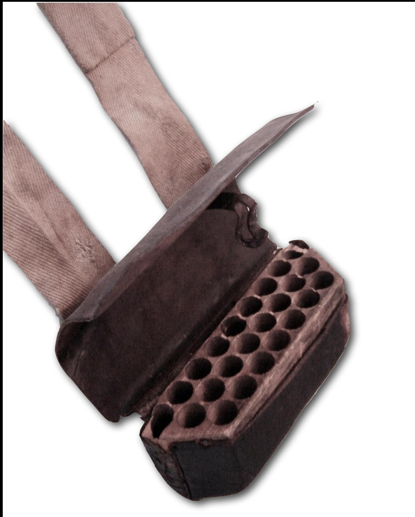
American 24 Round Cartridge Pouch