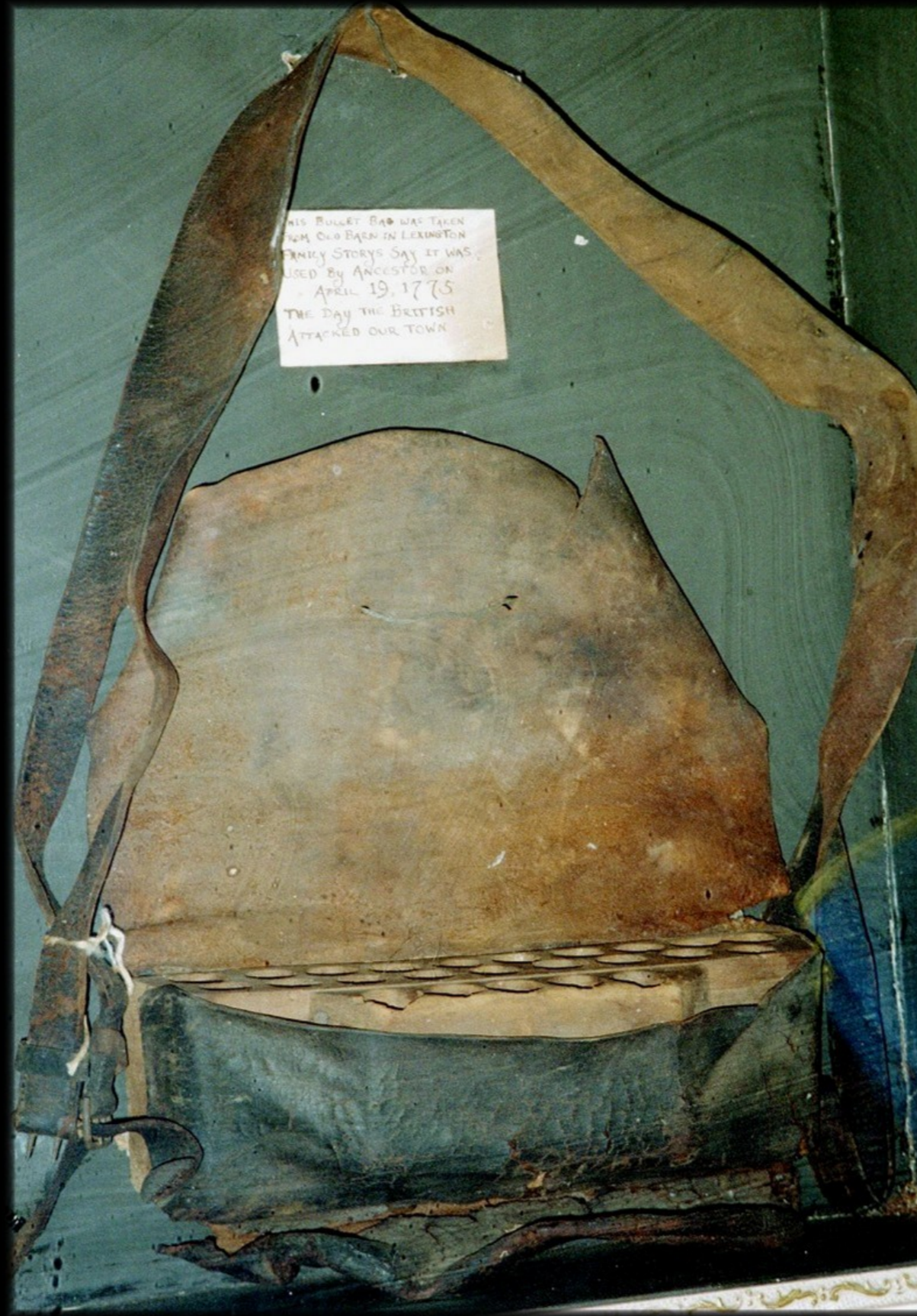
American 19 Round Cartridge Pouch with Added 5 Round Block from Massachusetts