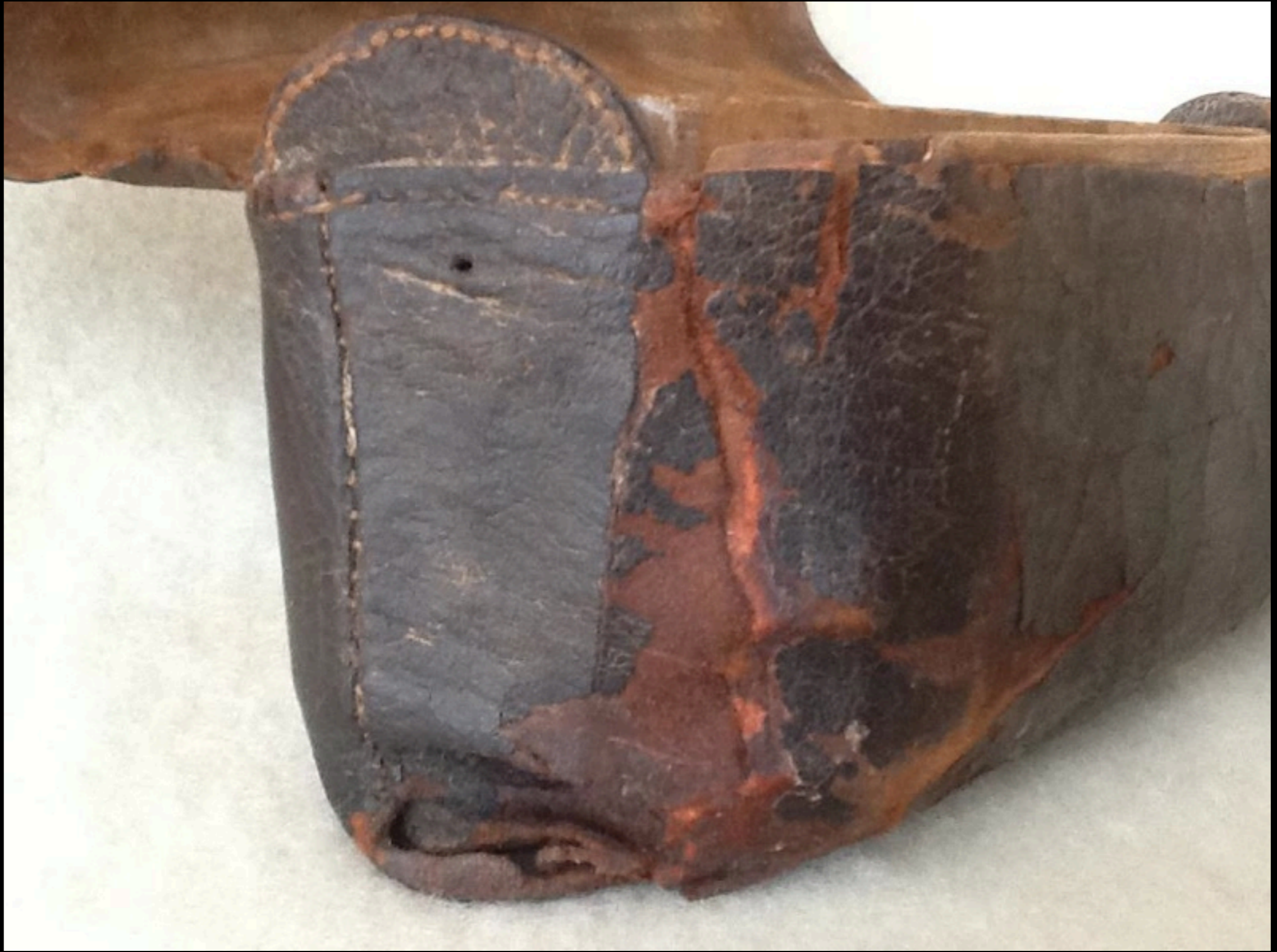
American 17 Round Cartridge Pouch with 7 Round Block Addition 18th Century (Private Collection)