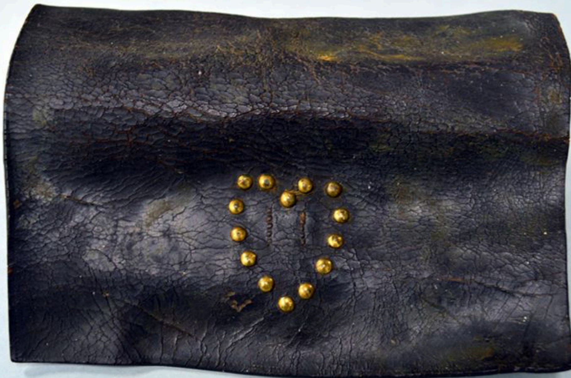
American Cartridge Pouch 18th Century (Museum of the American Revolution)