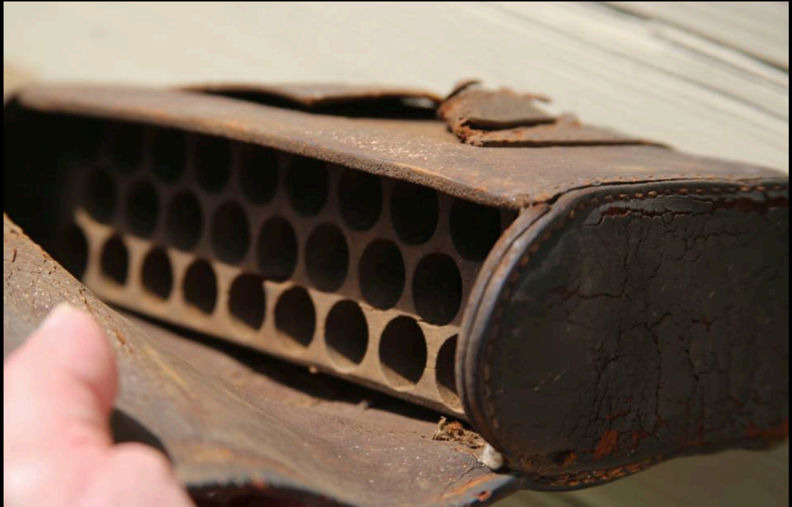
American New Model Cartridge Pouch of 1779 2nd Company - 6th Regiment - Possibly Connecticut (Don Troiani)