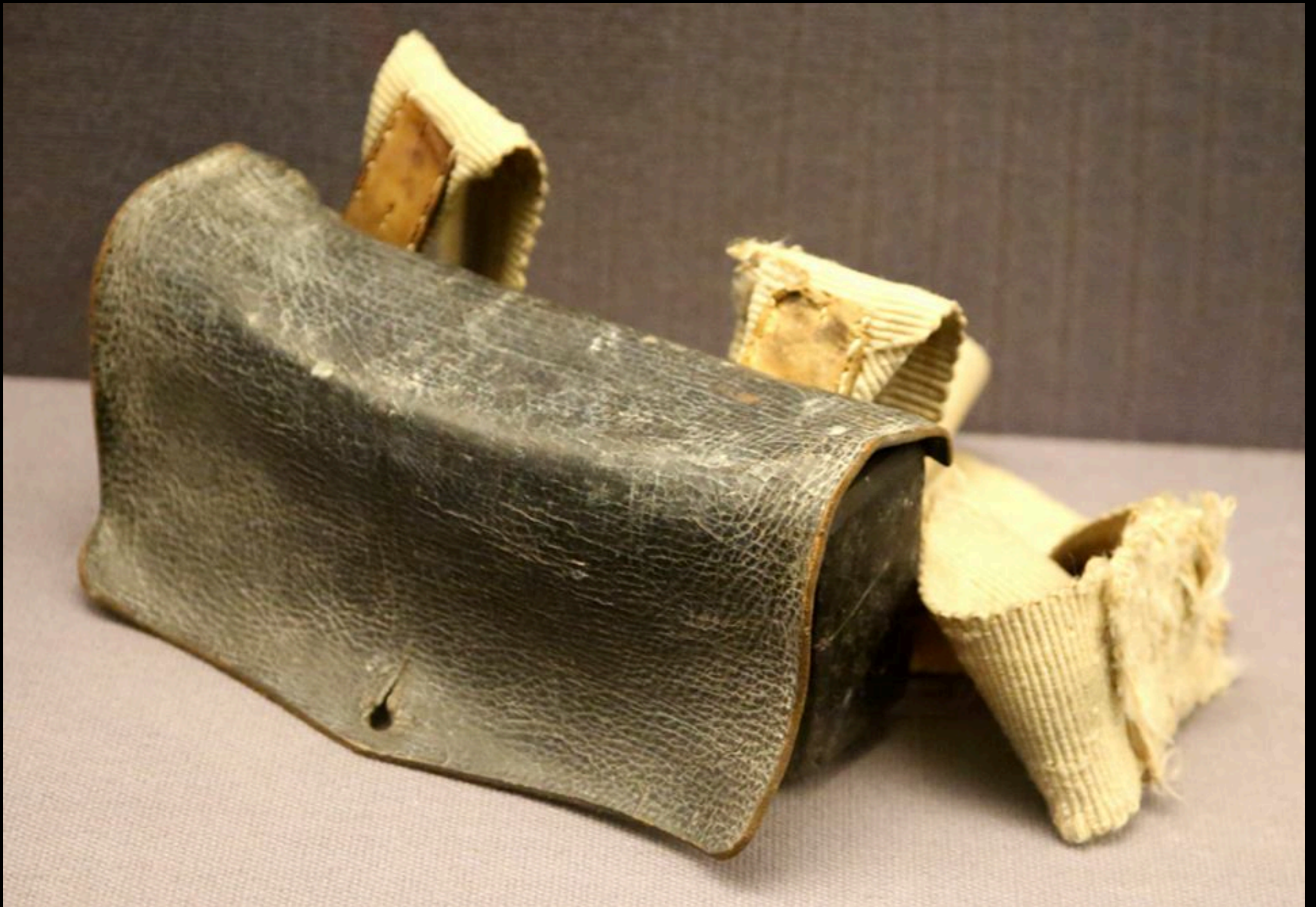
British Cartridge Box Concerted to an American Cartridge Pouch 18th Century (West Point Museum)