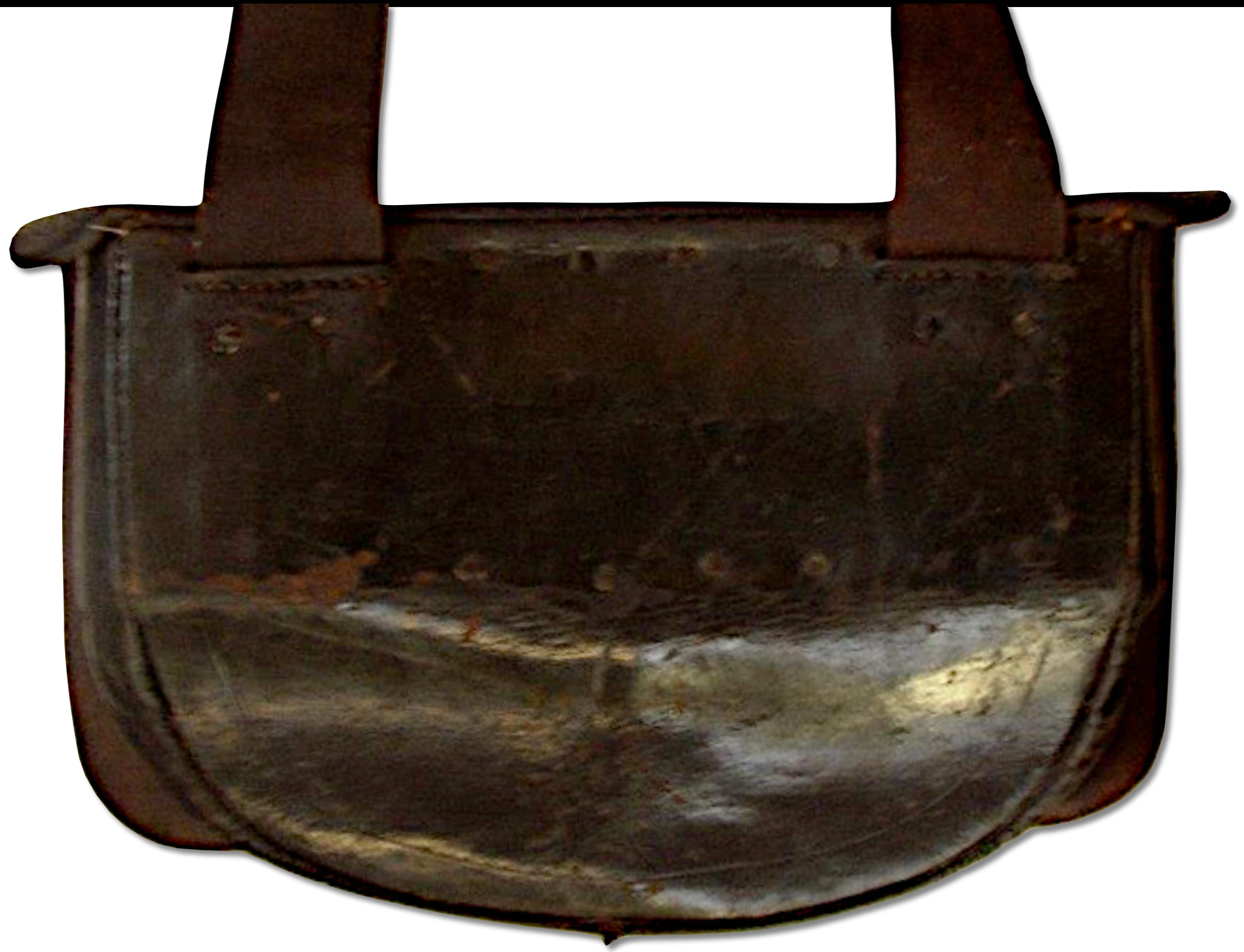
American Cartridge Pouch 18th Century (Private Collection)