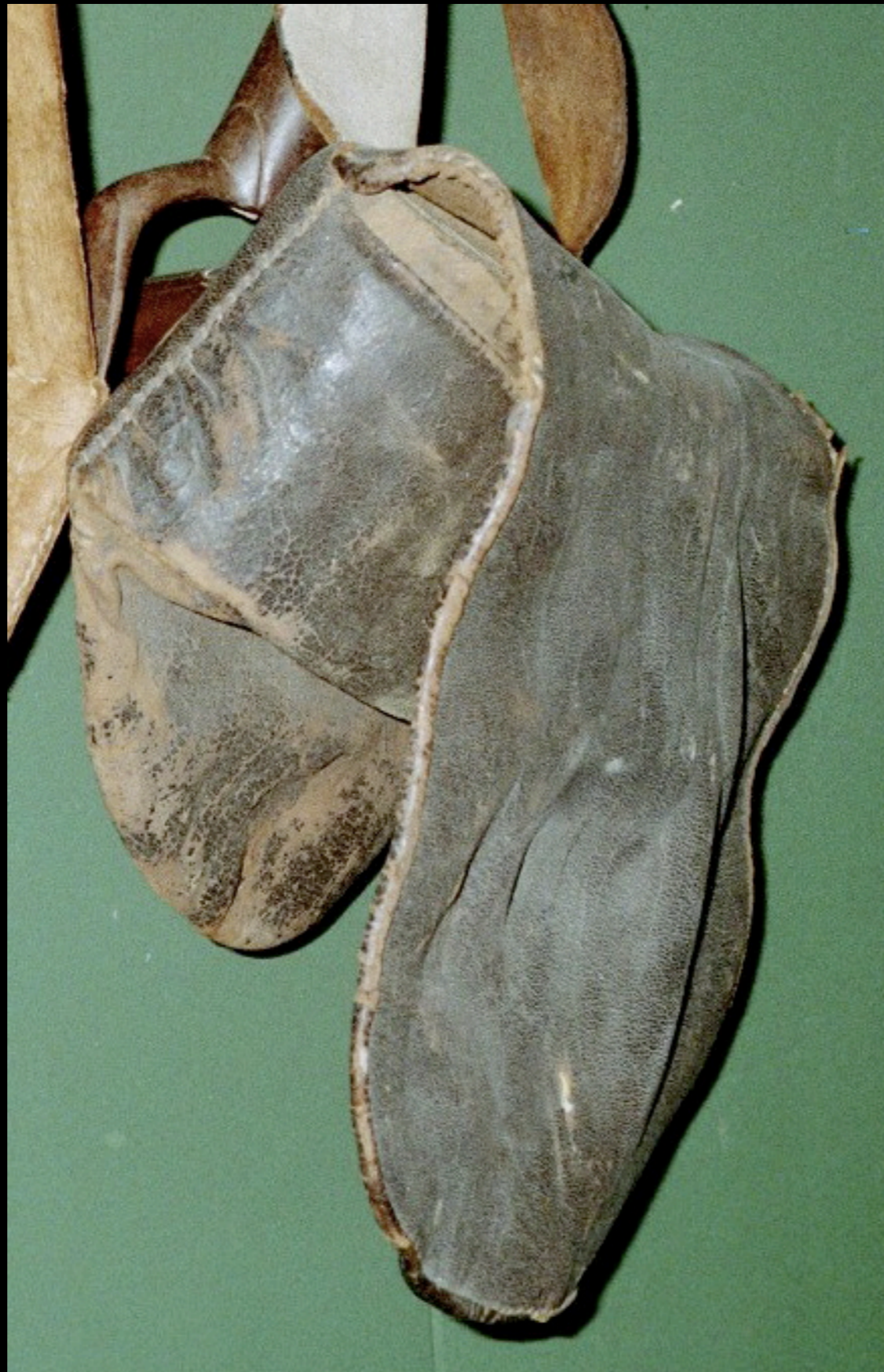
American 17 Round Cartridge Pouch from Massachusetts