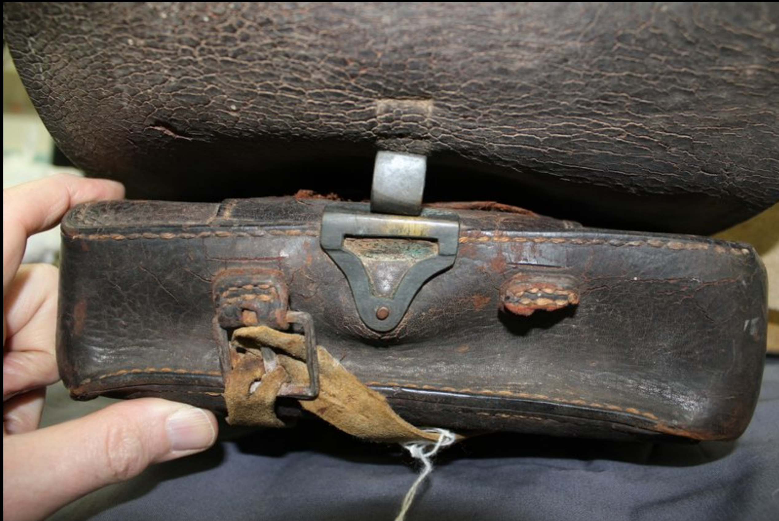
American New Model Cartridge Pouch of 1779 2nd Company - 6th Regiment - Possibly Connecticut (Don Troiani)