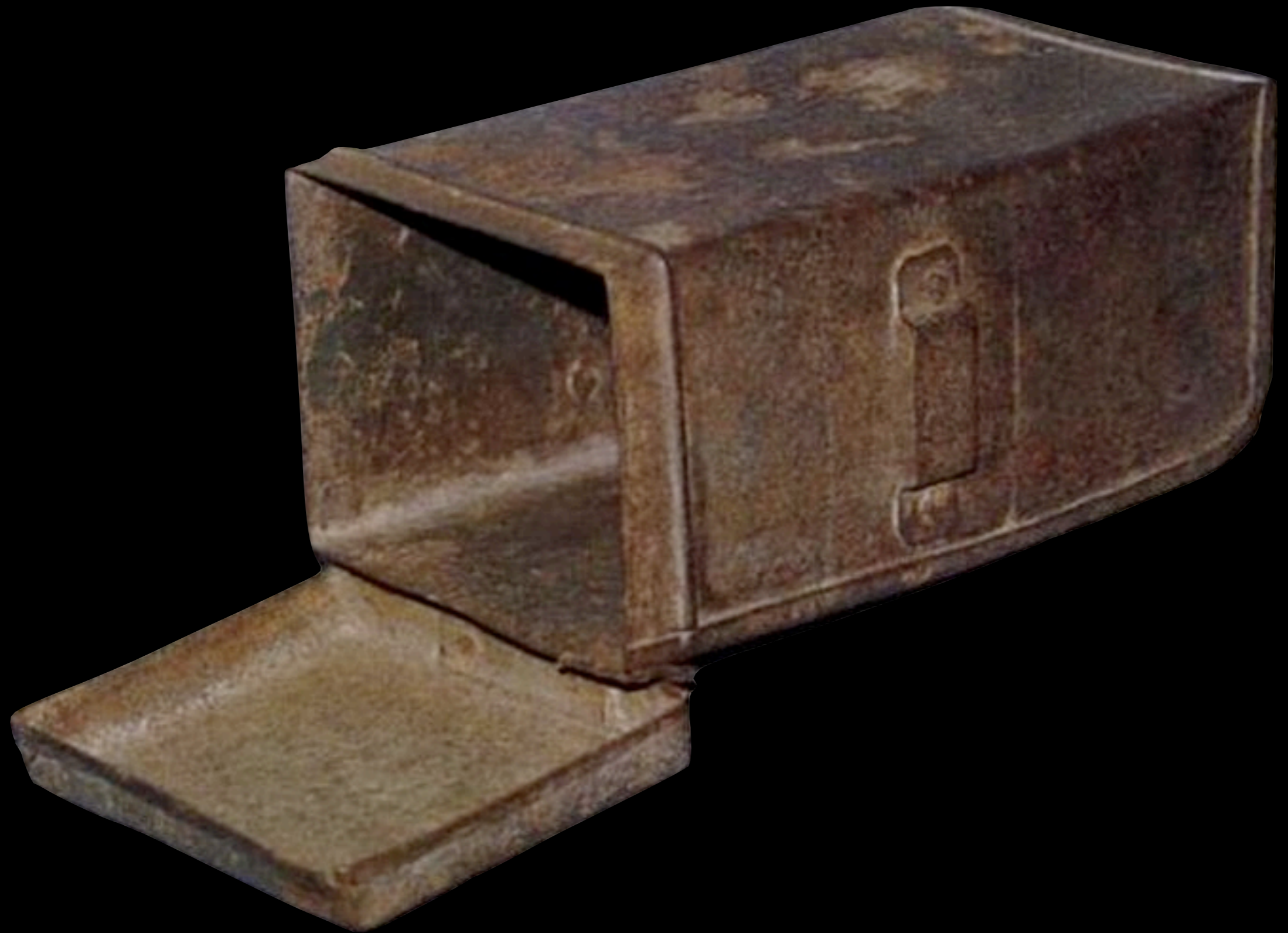
Tin Cartridge Canister 18th Century (Don Troiani)