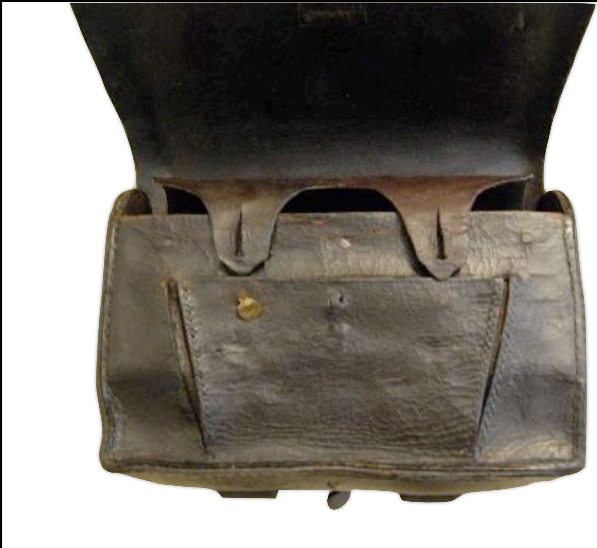
American 29 Round "New Model" Cartridge Pouch 18th Century

(Colonel J. Craig Nannos Collection - Photograph Courtesy Andrew Watson Kirk)