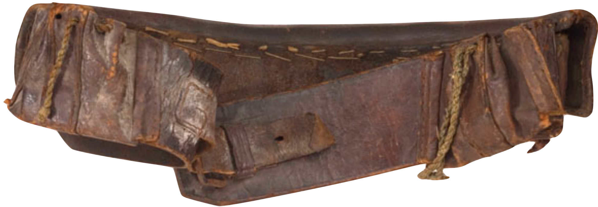
American 14 Round Cavalry Cartridge Box & Waistbelt c. 1775 - 1800