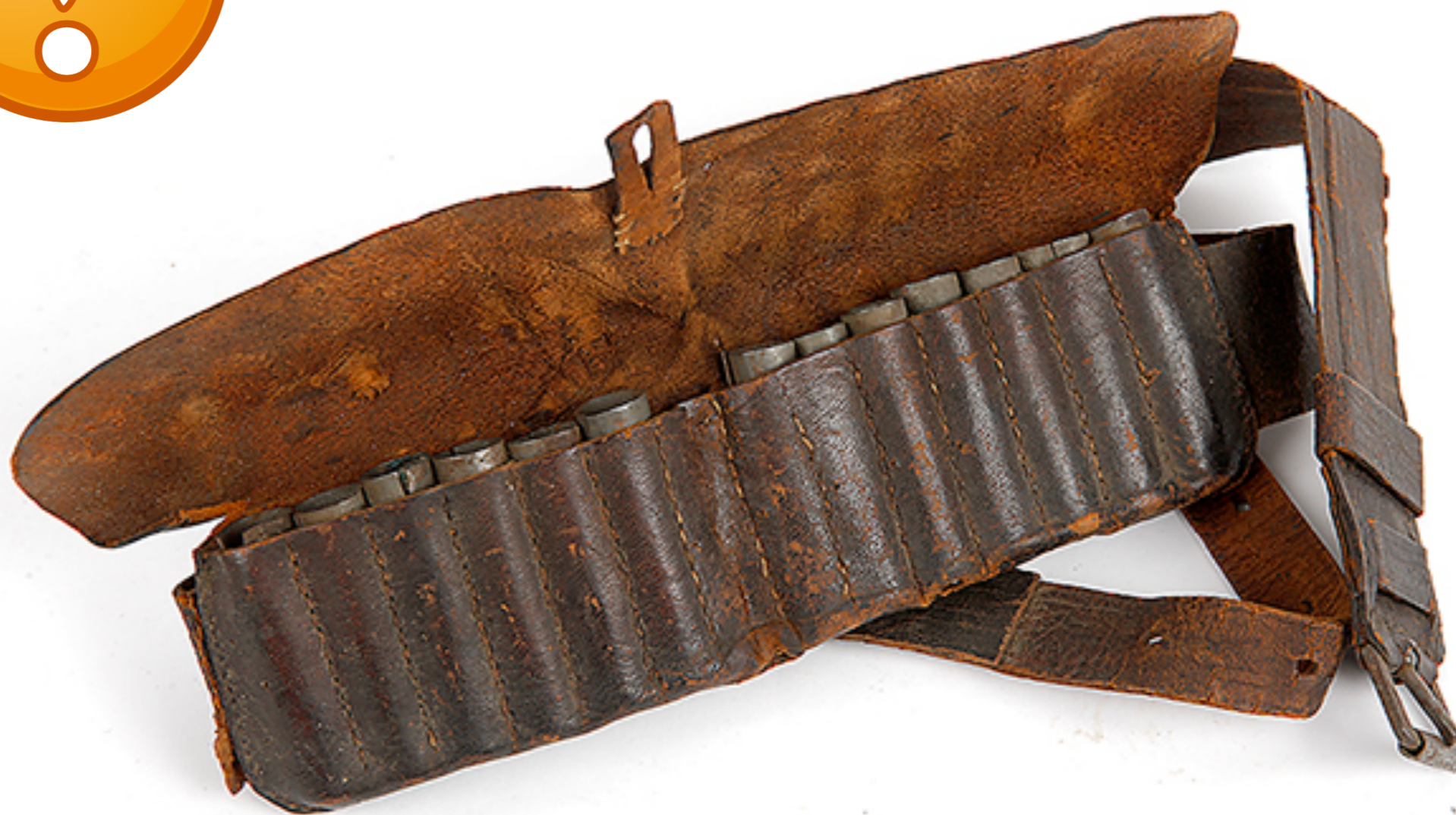
American 14 Round Cavalry Cartridge Box & Waistbelt c. 1775 - 1800 (Ira & Larry Goldberg Auctions)