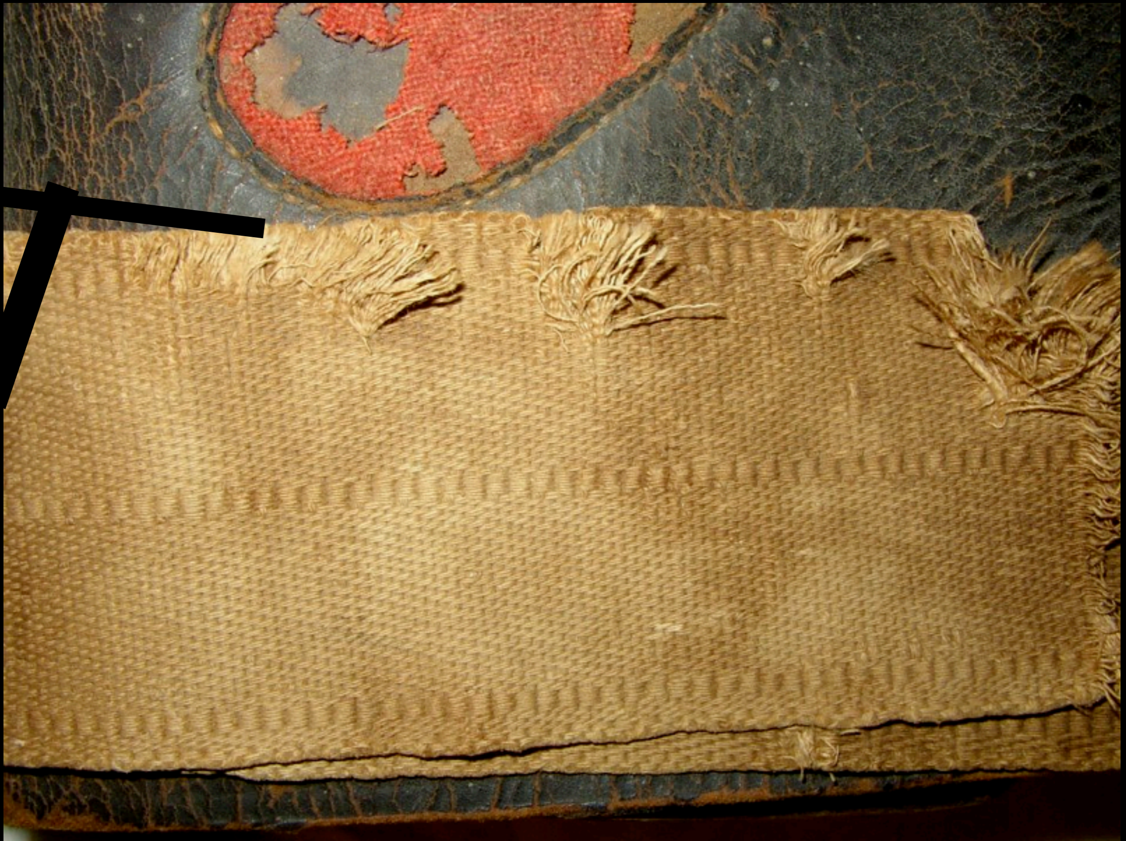
American Cartridge Pouch Tailored Bottom, Linen and Wool Shoulder Strap, Red Wool Heart on Flap. c. 1770 - 1800 (Private Collection)