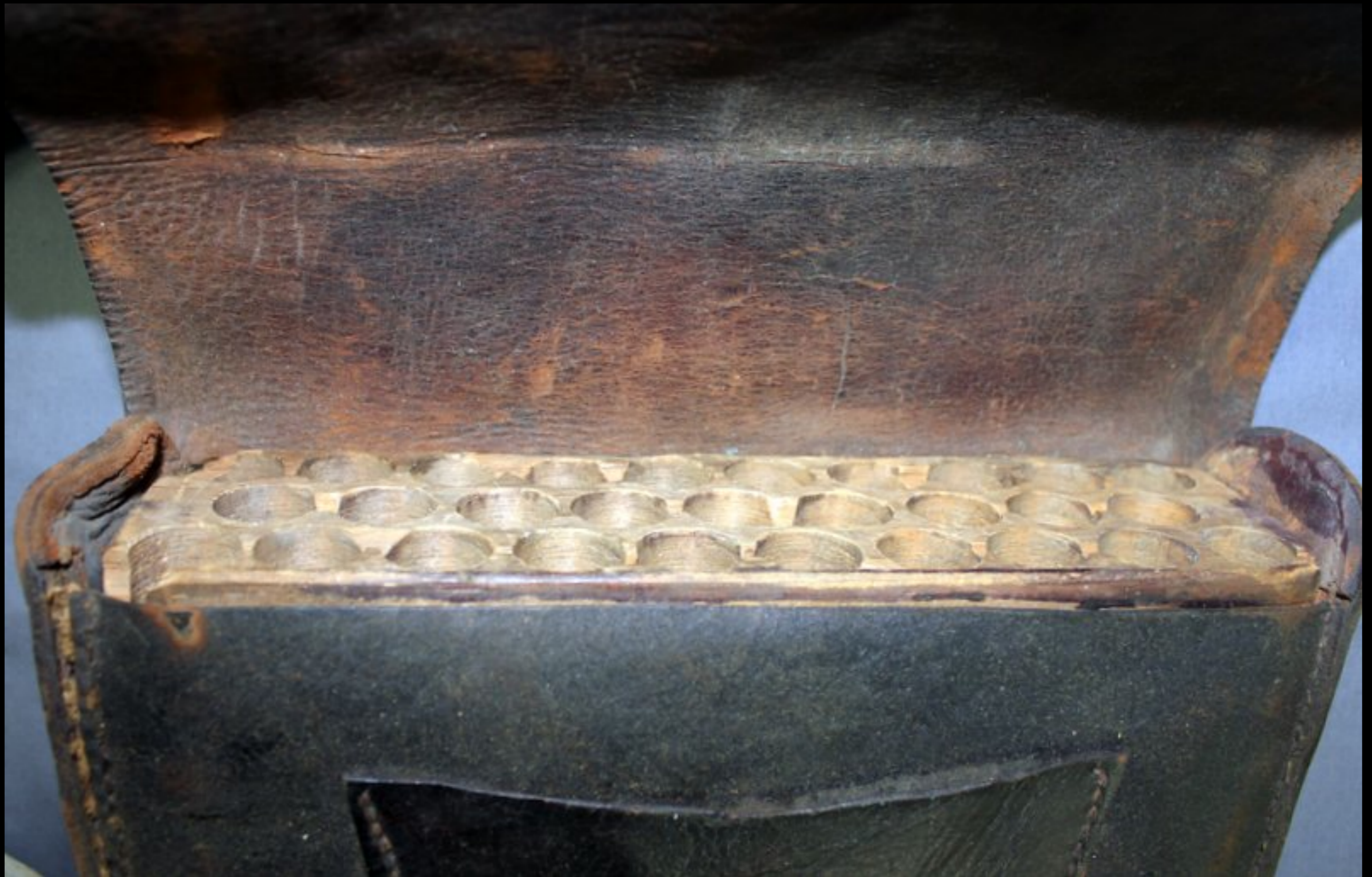
American Pouch Similar to the "British System" Pouch 18th Century (Don Troiani)