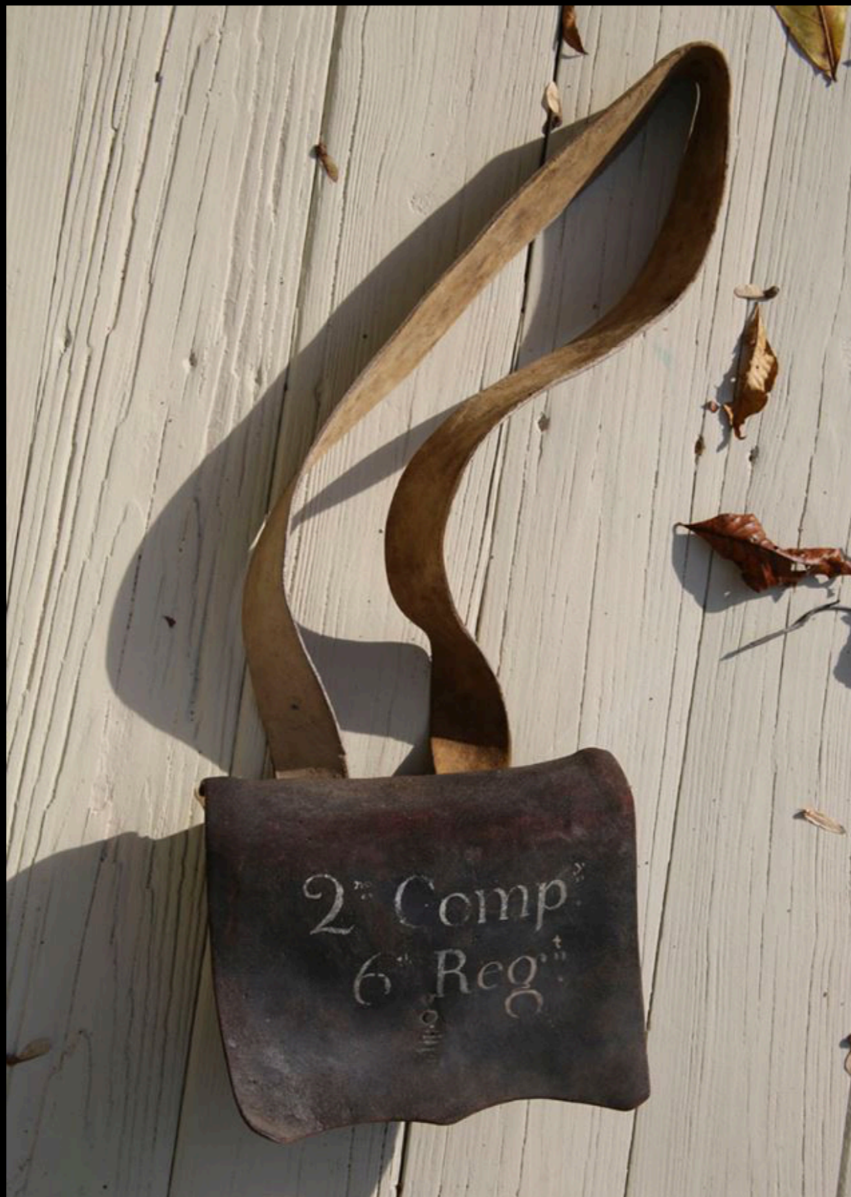
American New Model Cartridge Pouch of 1779 2nd Company - 6th Regiment - Possibly Connecticut (Don Troiani)