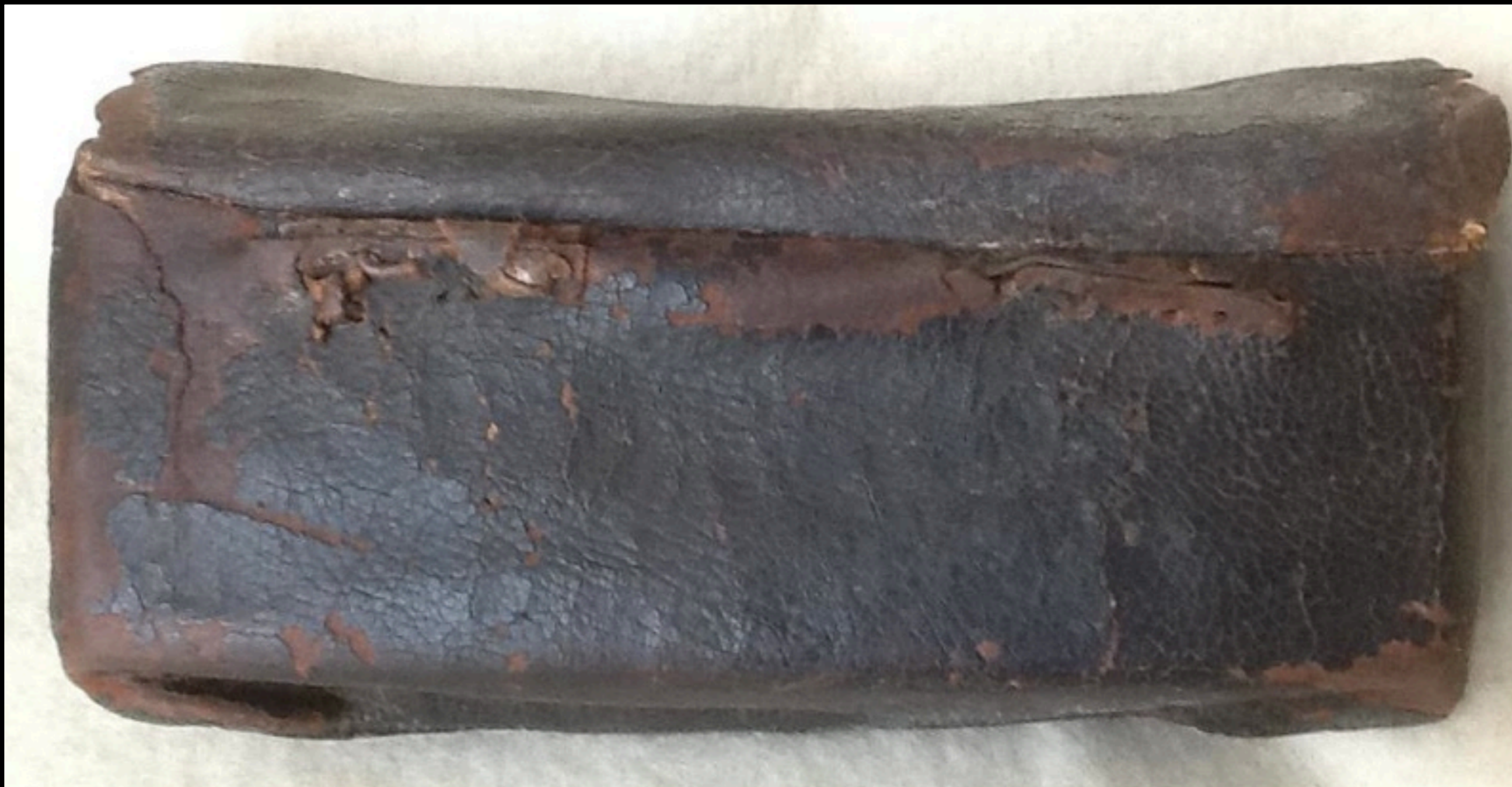
American 17 Round Cartridge Pouch with 7 Round Block Addition 18th Century (Private Collection)