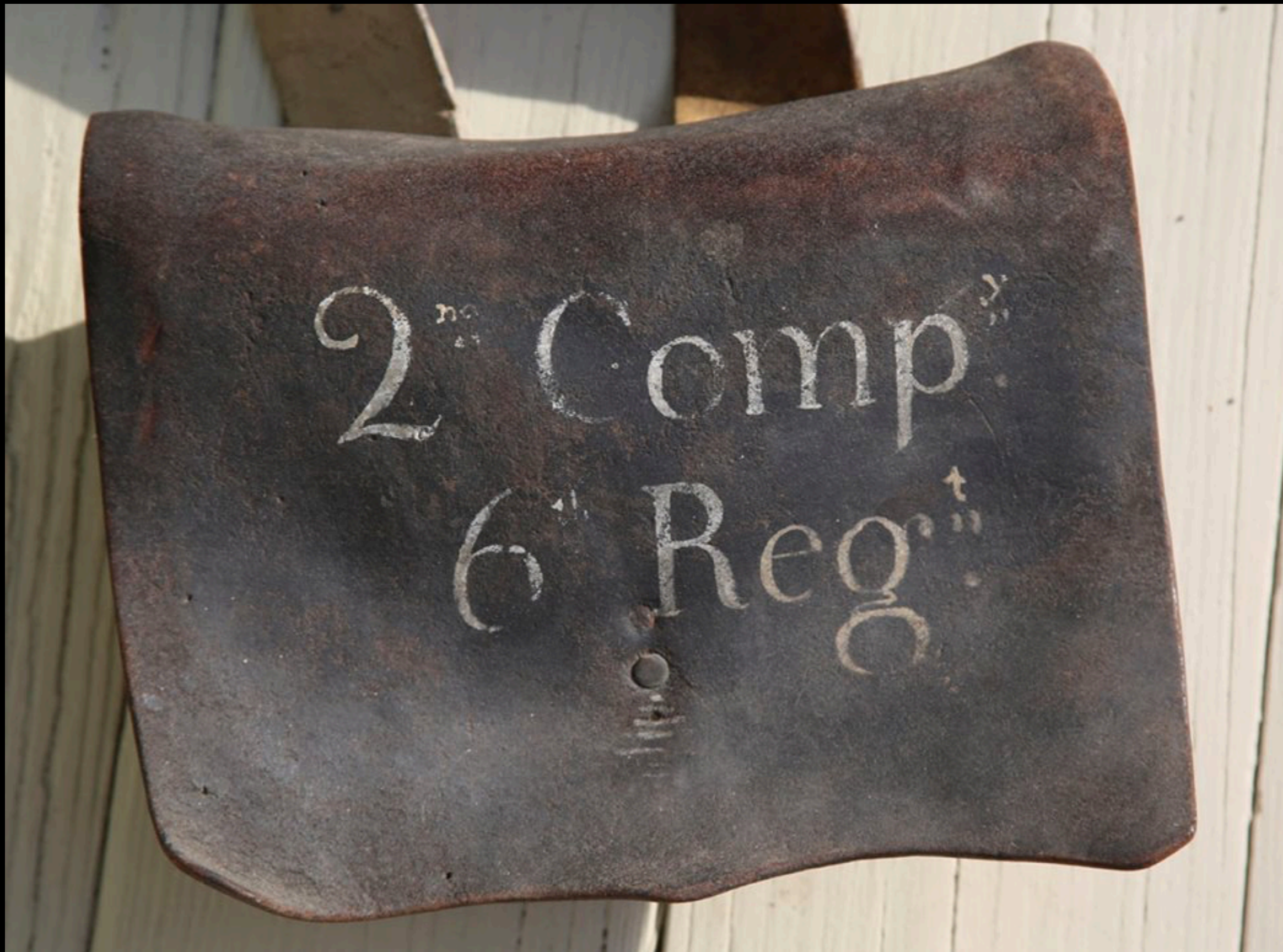
American New Model Cartridge Pouch of 1779 2nd Company - 6th Regiment - Possibly Connecticut (Don Troiani)