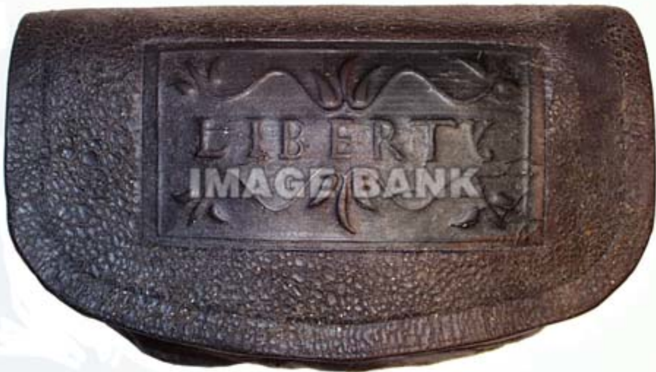
American Cartridge Pouch Embossed "LIBERTY"