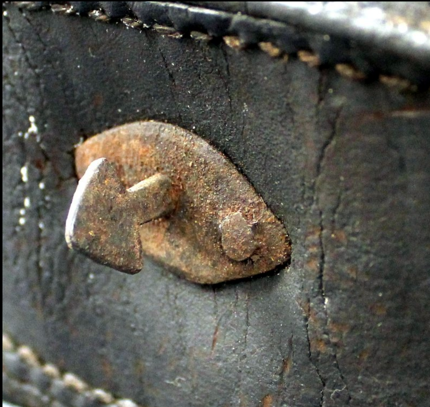
American New Invented Cartridge Pouch Stamped "U. STATES" with "American System" Closure (Don Troiani)