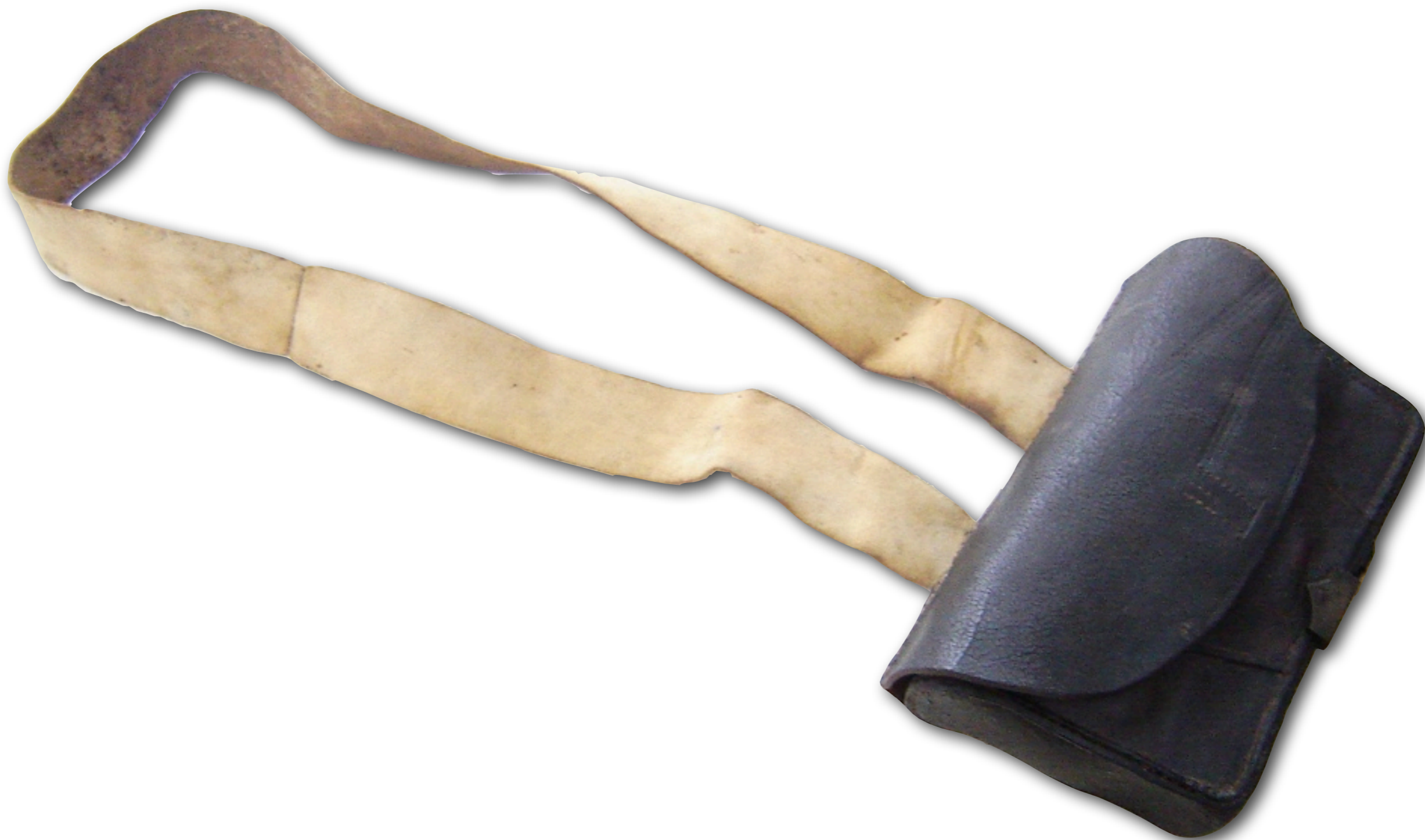
American 18 Round Modified British Light Infantry - Sergeants Pouch with Tin Tray