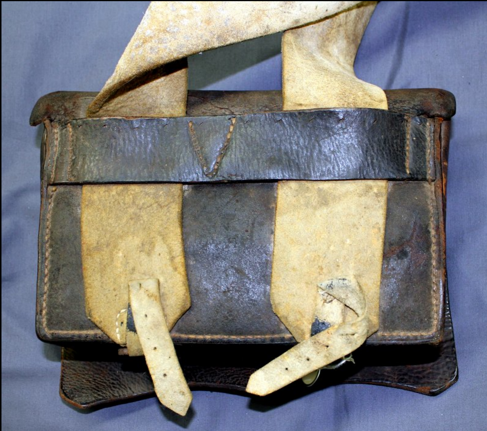
American Pouch Similar to the "British System" Pouch 18th Century (Don Troiani)