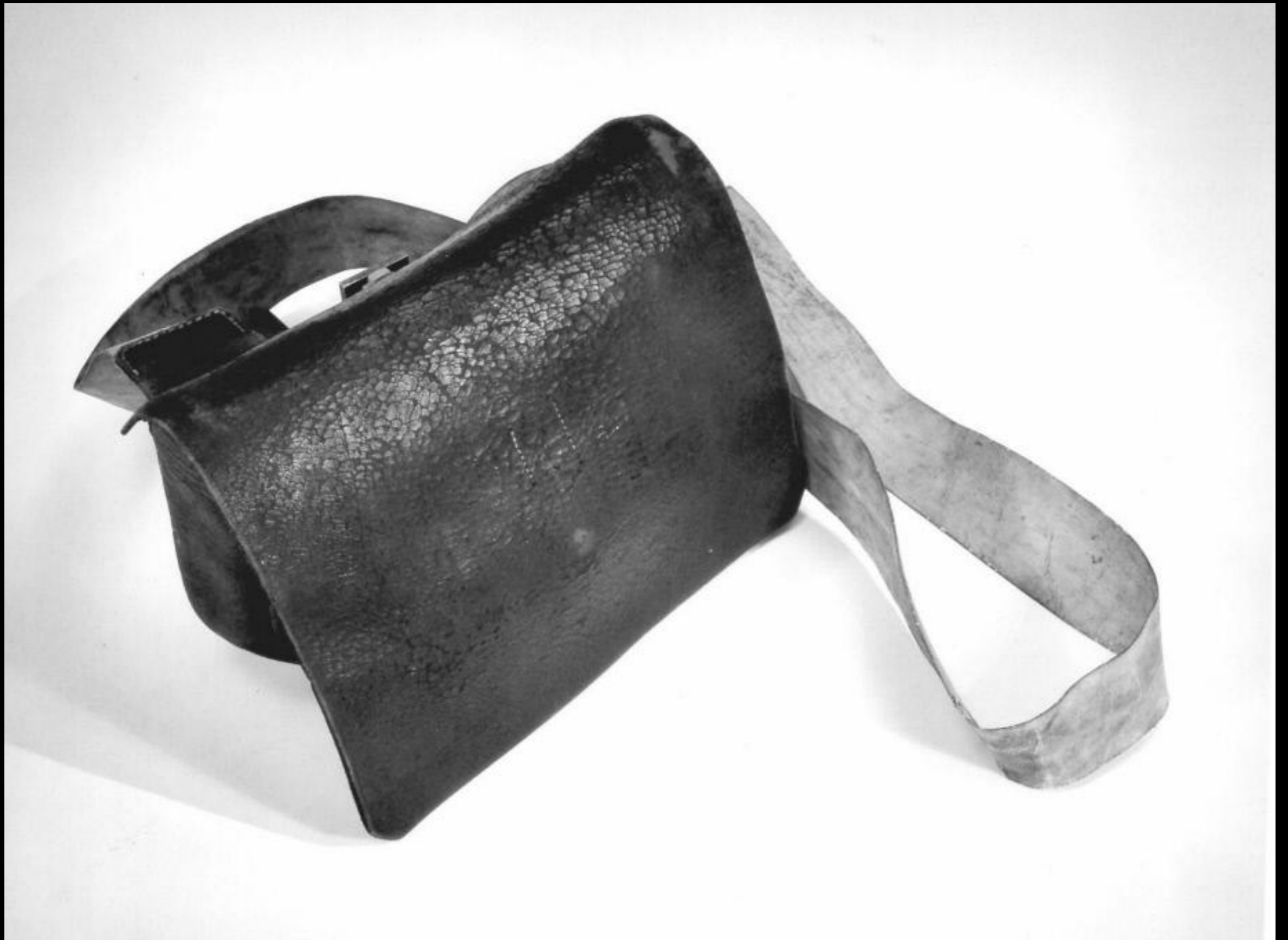
American or English 24 Round Cartridge Pouch c. 1760 - 1800 (Colonial Williamsburg Foundation)