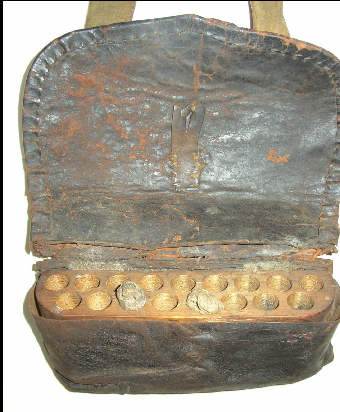
American 17 Round Cartridge Pouch 18th Century (Private Collection)