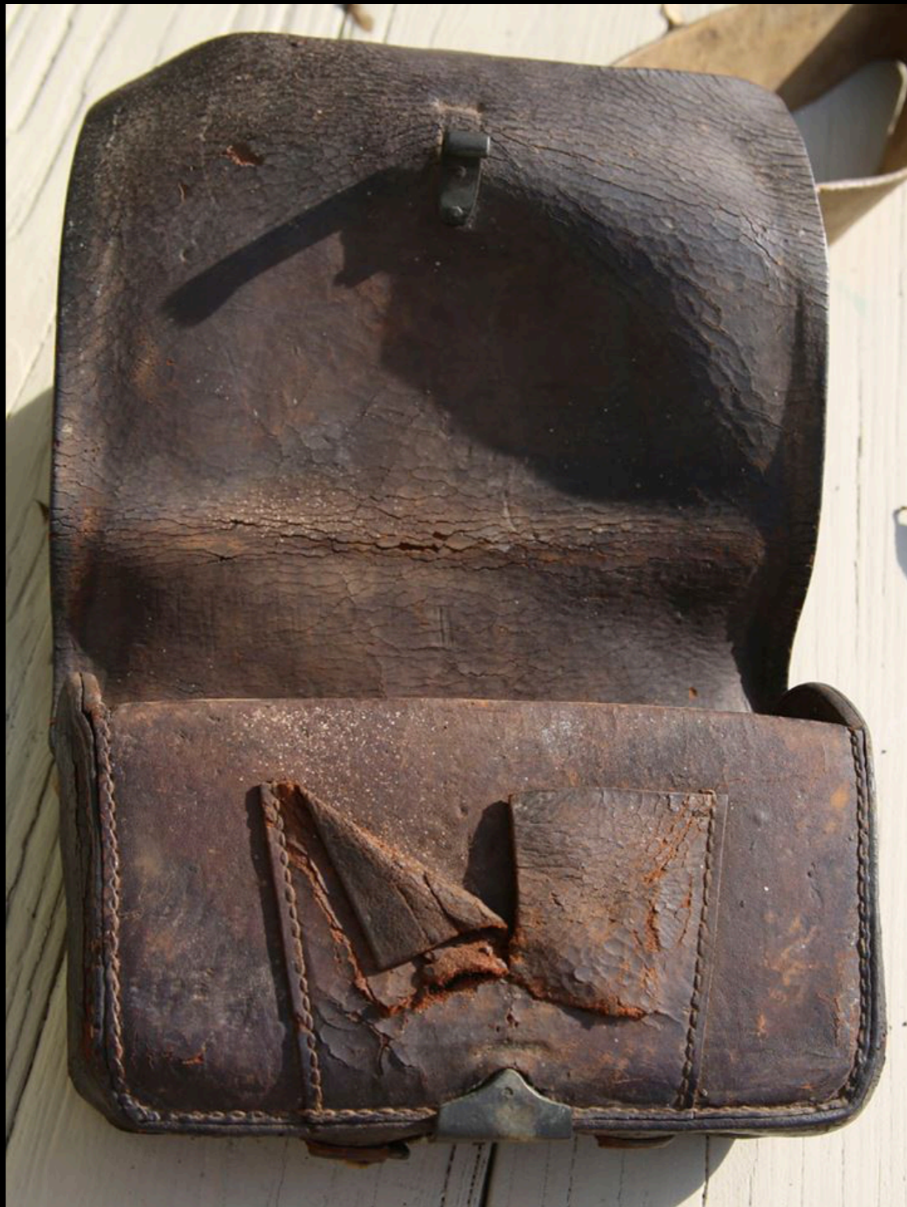
American New Model Cartridge Pouch of 1779 2nd Company - 6th Regiment - Possibly Connecticut (Don Troiani)