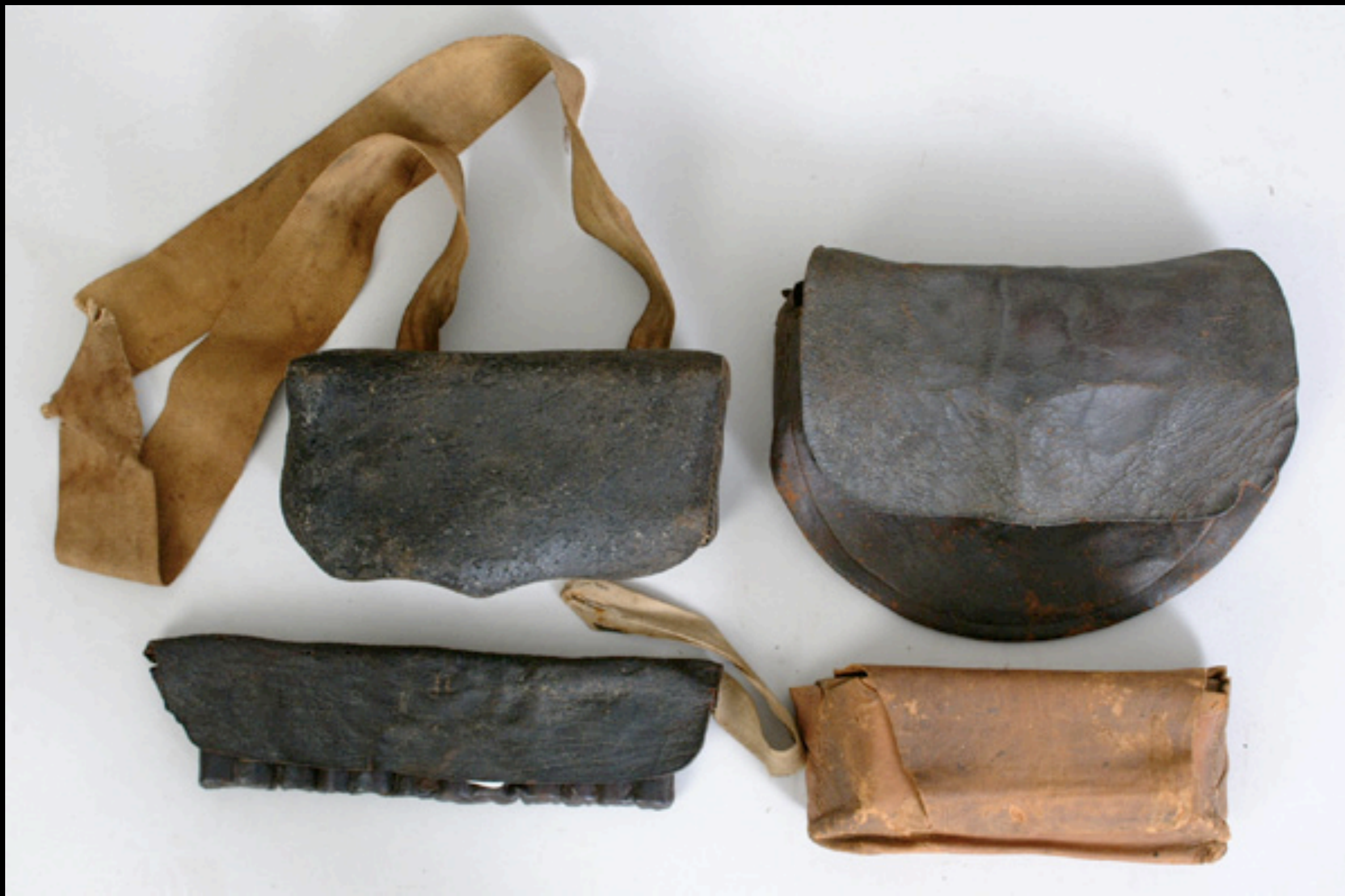
Two Cartridge Pouches and Two Belly Boxes 18th Century (Estate of Tom Wnuck)