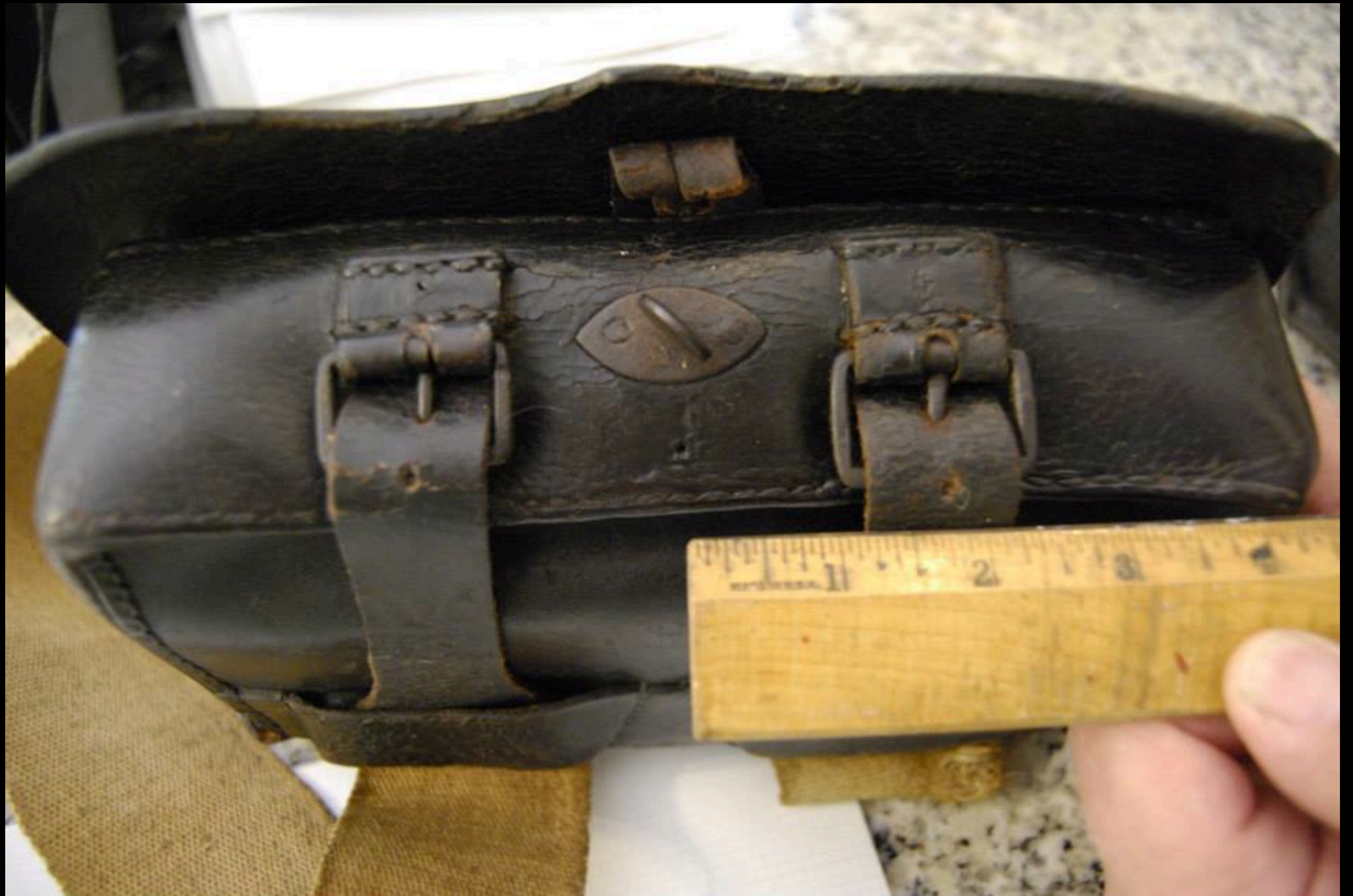
American 29 Round "New Model" Cartridge Pouch 18th Century

(Colonel J. Craig Nannos Collection - Photograph Courtesy Andrew Watson Kirk)