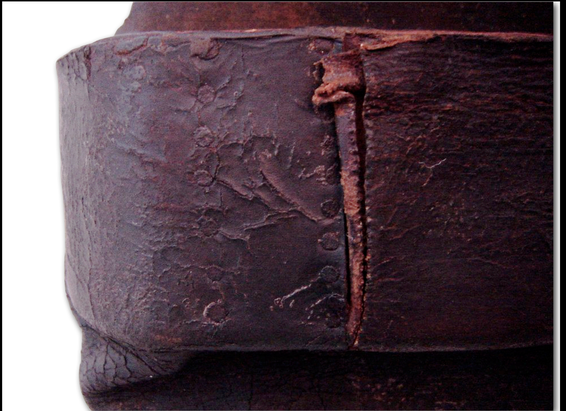
American 30 Round Cartridge Pouch 18th Century

(Colonel Craig J. Nannos Collection)