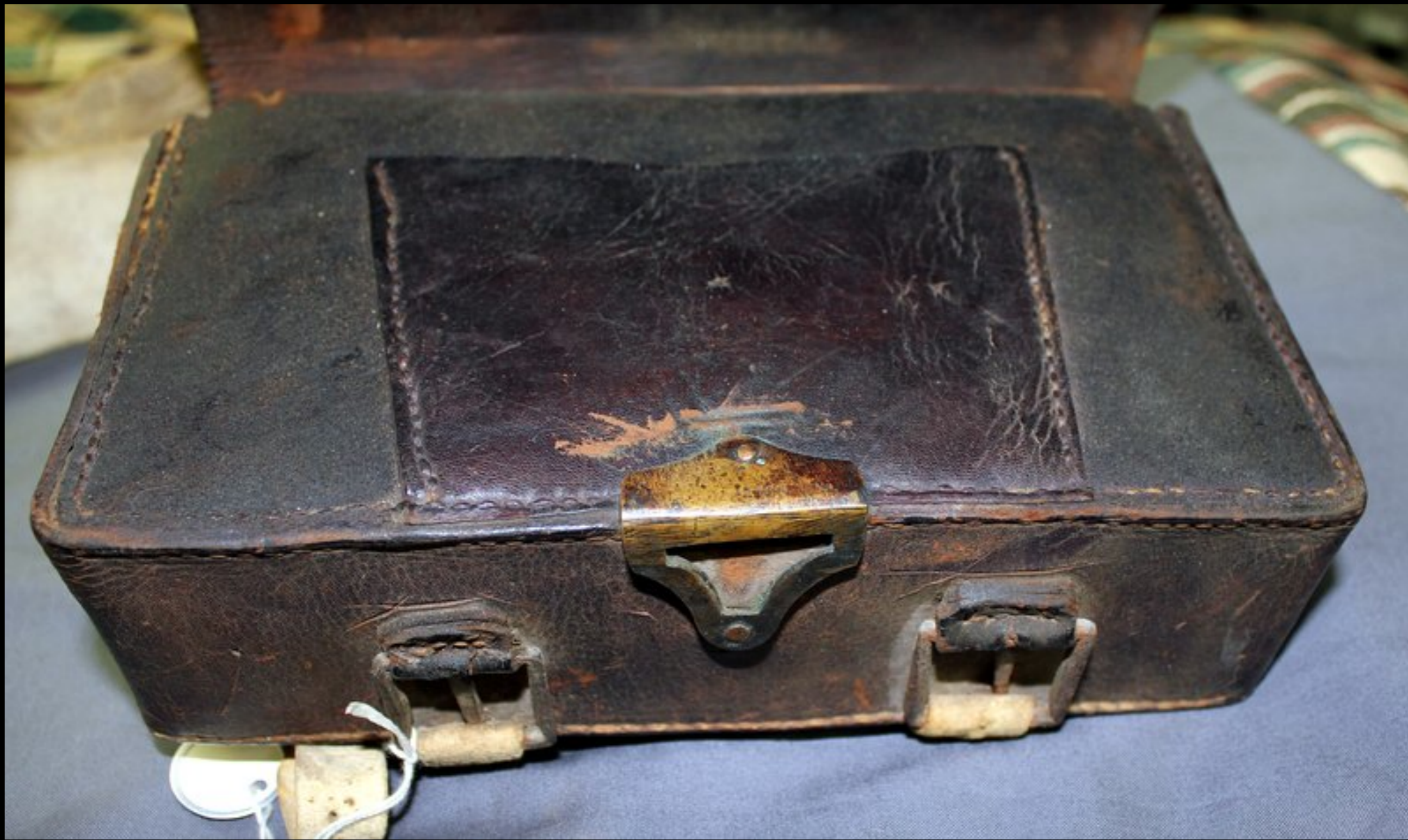
American Pouch Similar to the "British System" Pouch 18th Century (Don Troiani)