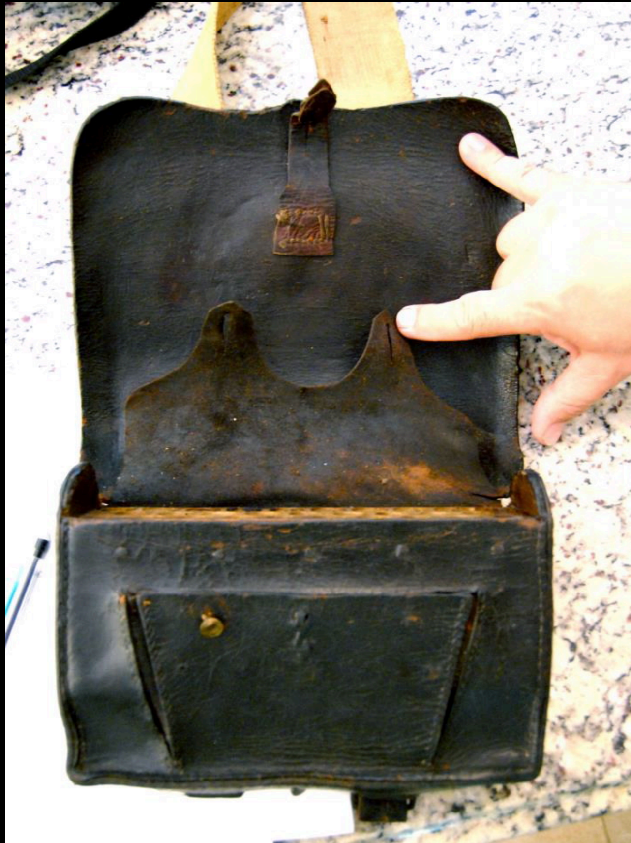
American 29 Round "New Model" Cartridge Pouch 18th Century

(Colonel J. Craig Nannos Collection - Photograph Courtesy Andrew Watson Kirk)