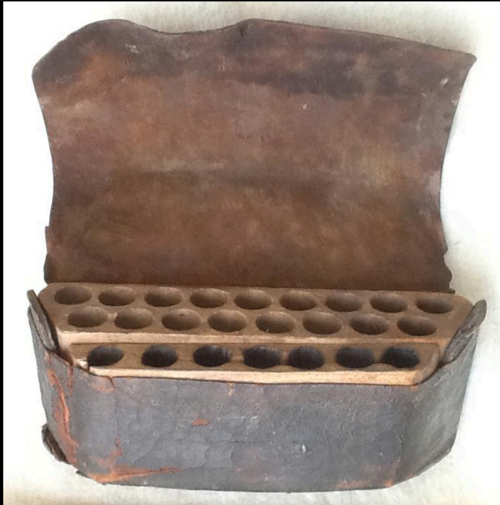
American 17 Round Cartridge Pouch with 7 Round Block Addition 18th Century (Private Collection)