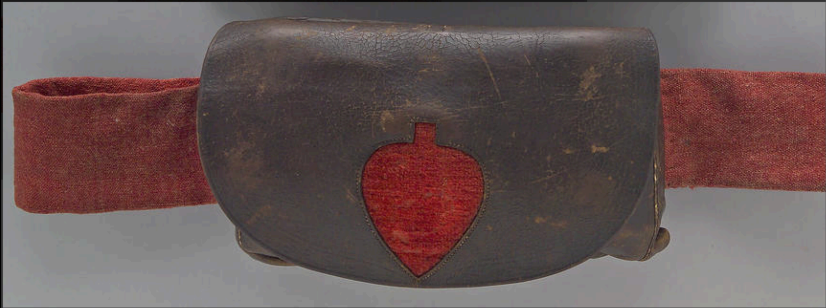
American Cartridge Box with Cloth Covered Waistbelt 18th Century