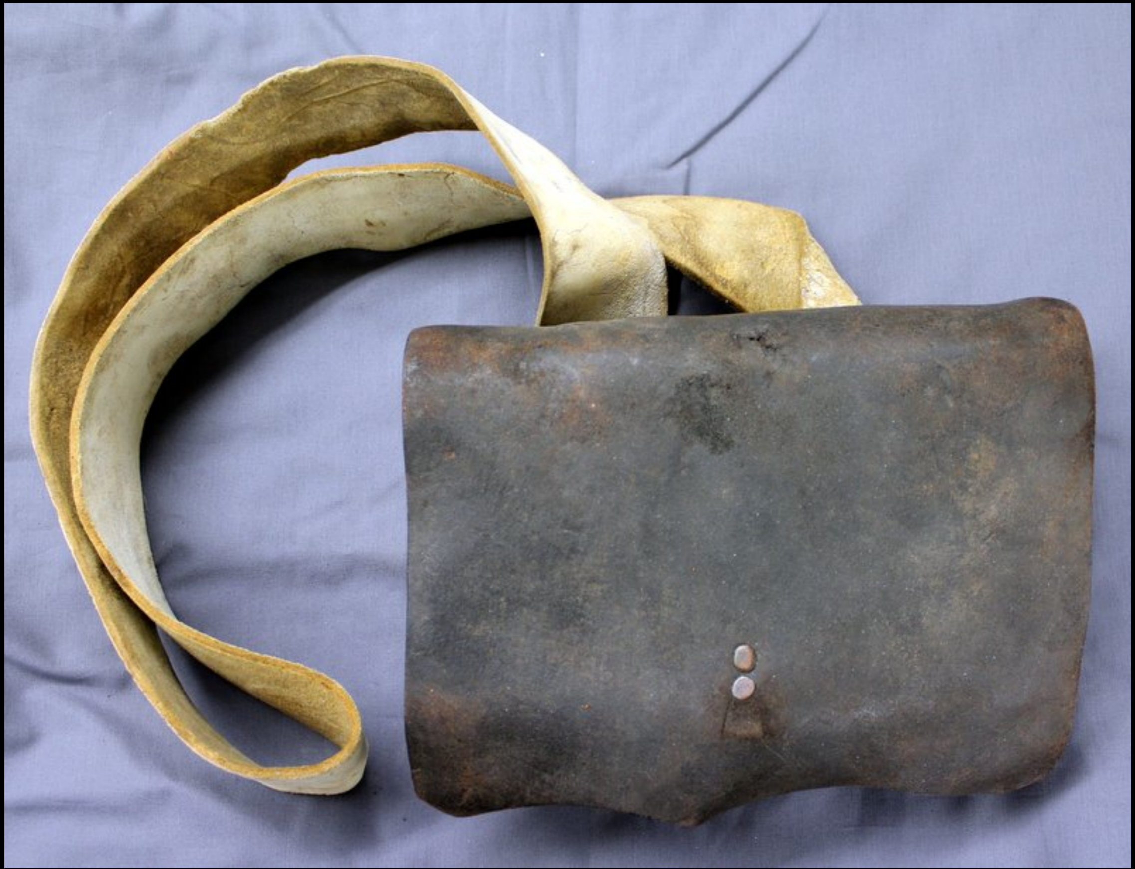
American Pouch Similar to the "British System" Pouch 18th Century (Don Troiani)