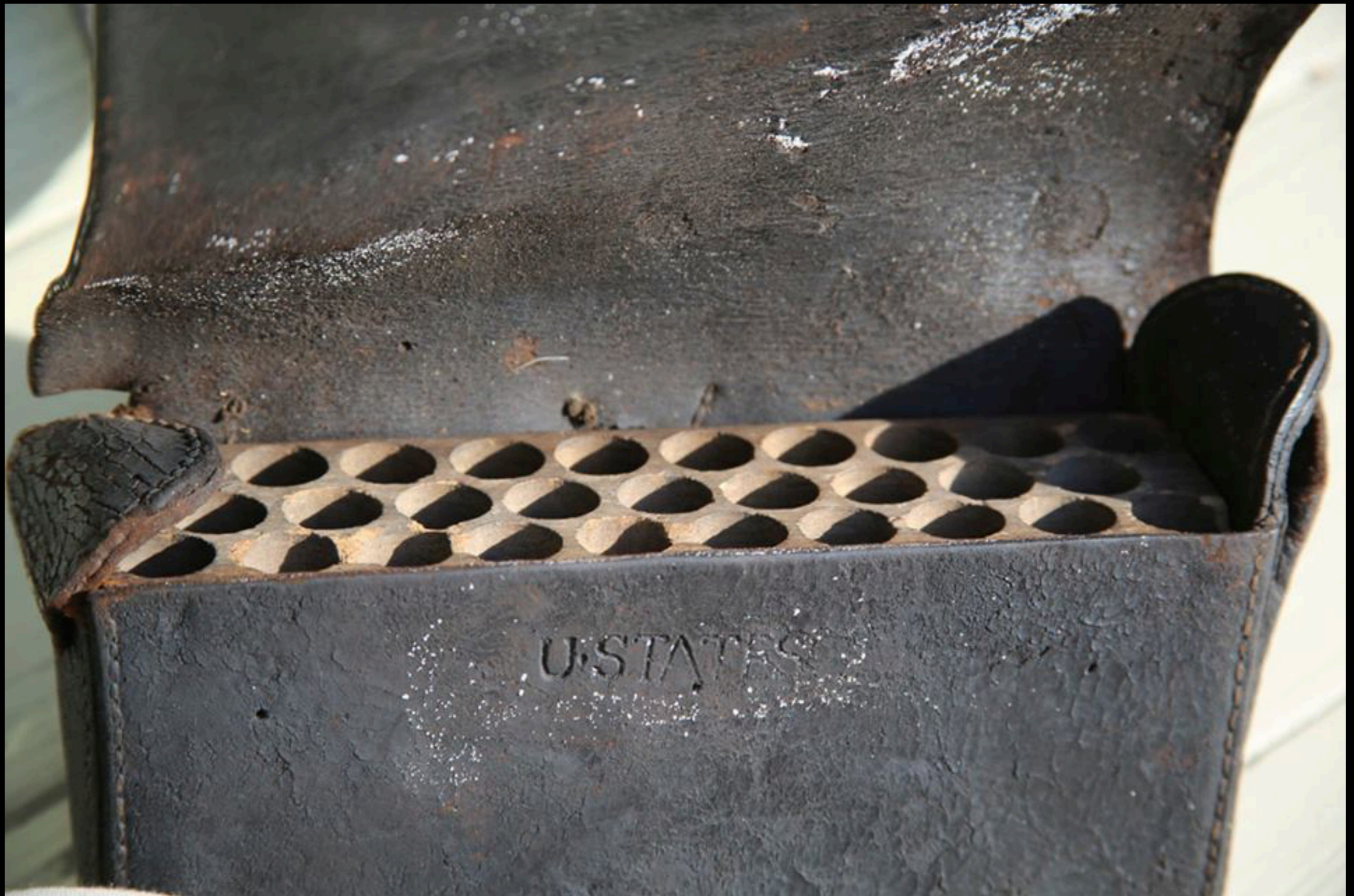
American New Invented Cartridge Pouch Stamped "U. STATES" with "American System" Closure (Don Troiani)