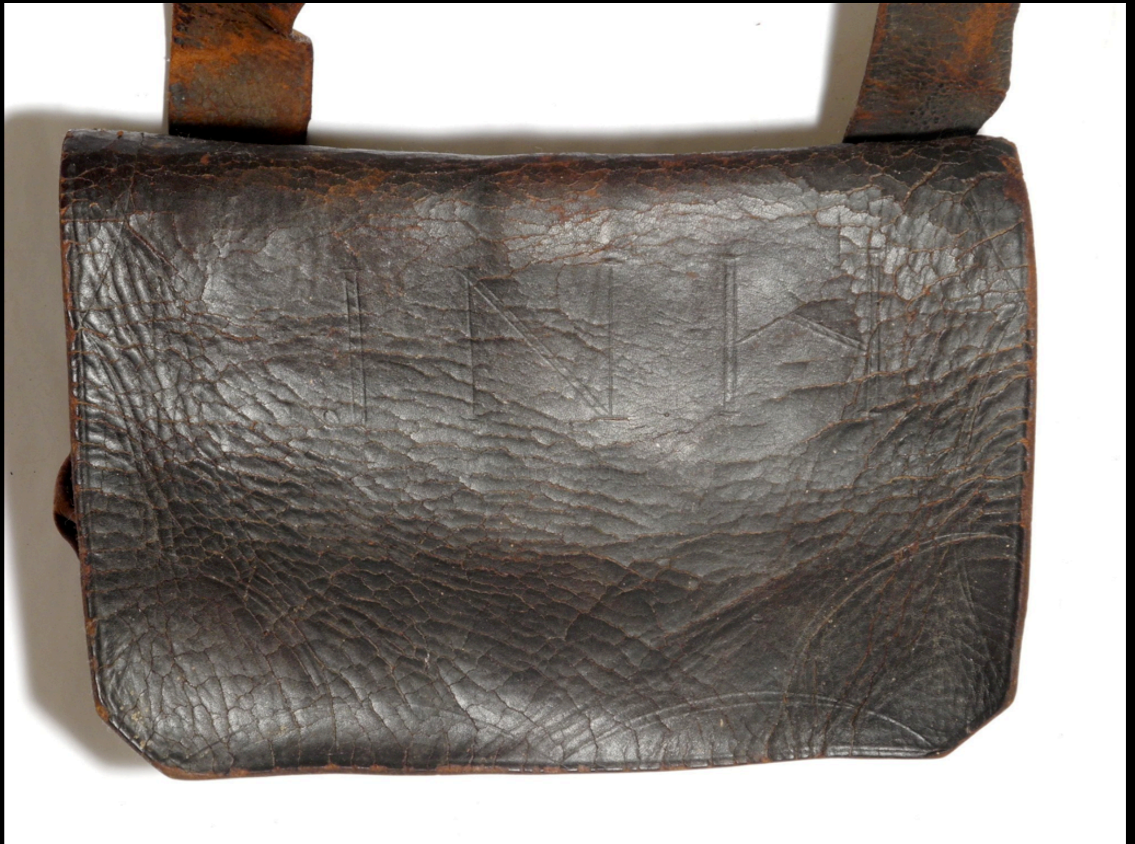
American 24 Round Cartridge Pouch 18th Century