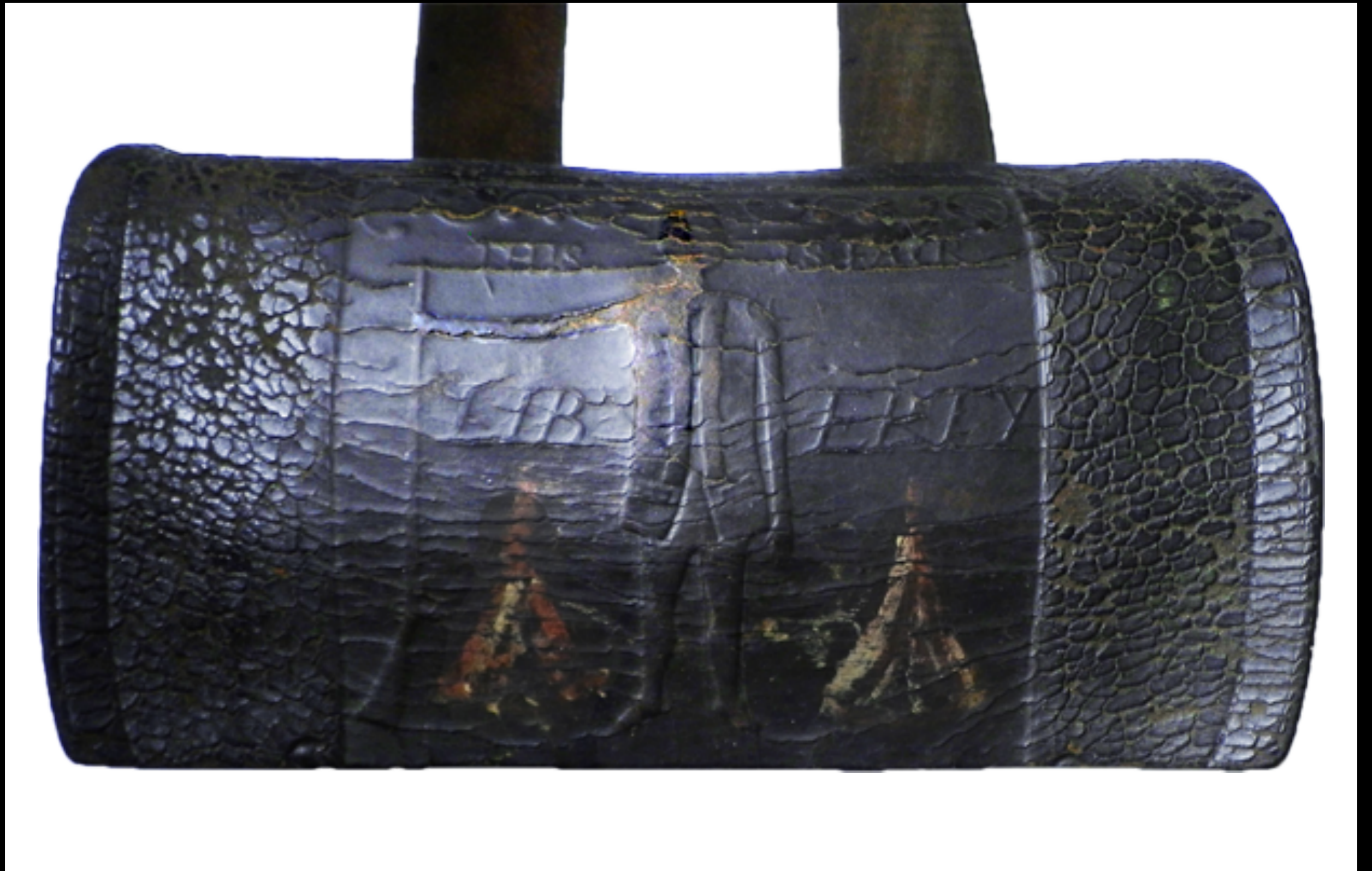
American Cartridge Pouch "THIS IS FAIR LIBERTY" (Fort Ticonderoga)