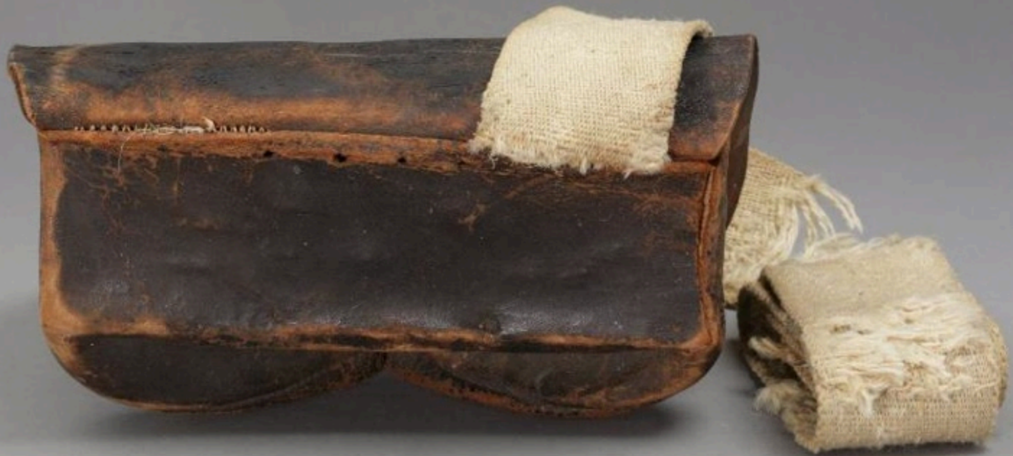
American 24 Round Cartridge Pouch 18th Century (Private Collection)