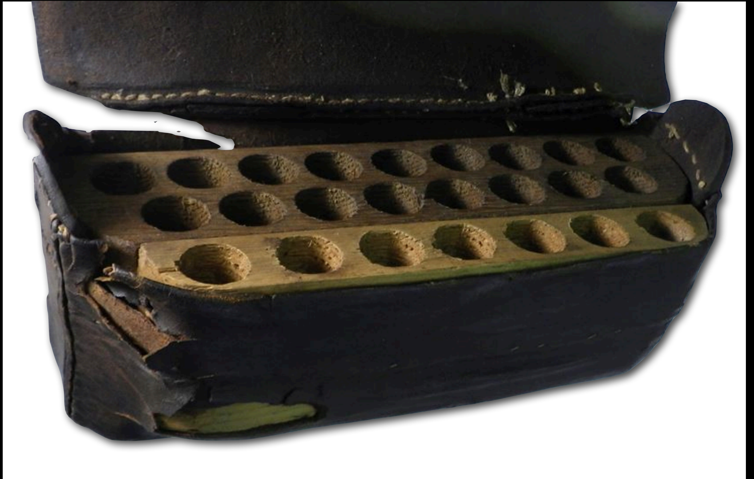
American Cartridge Pouch "THIS IS FAIR LIBERTY" (Fort Ticonderoga)