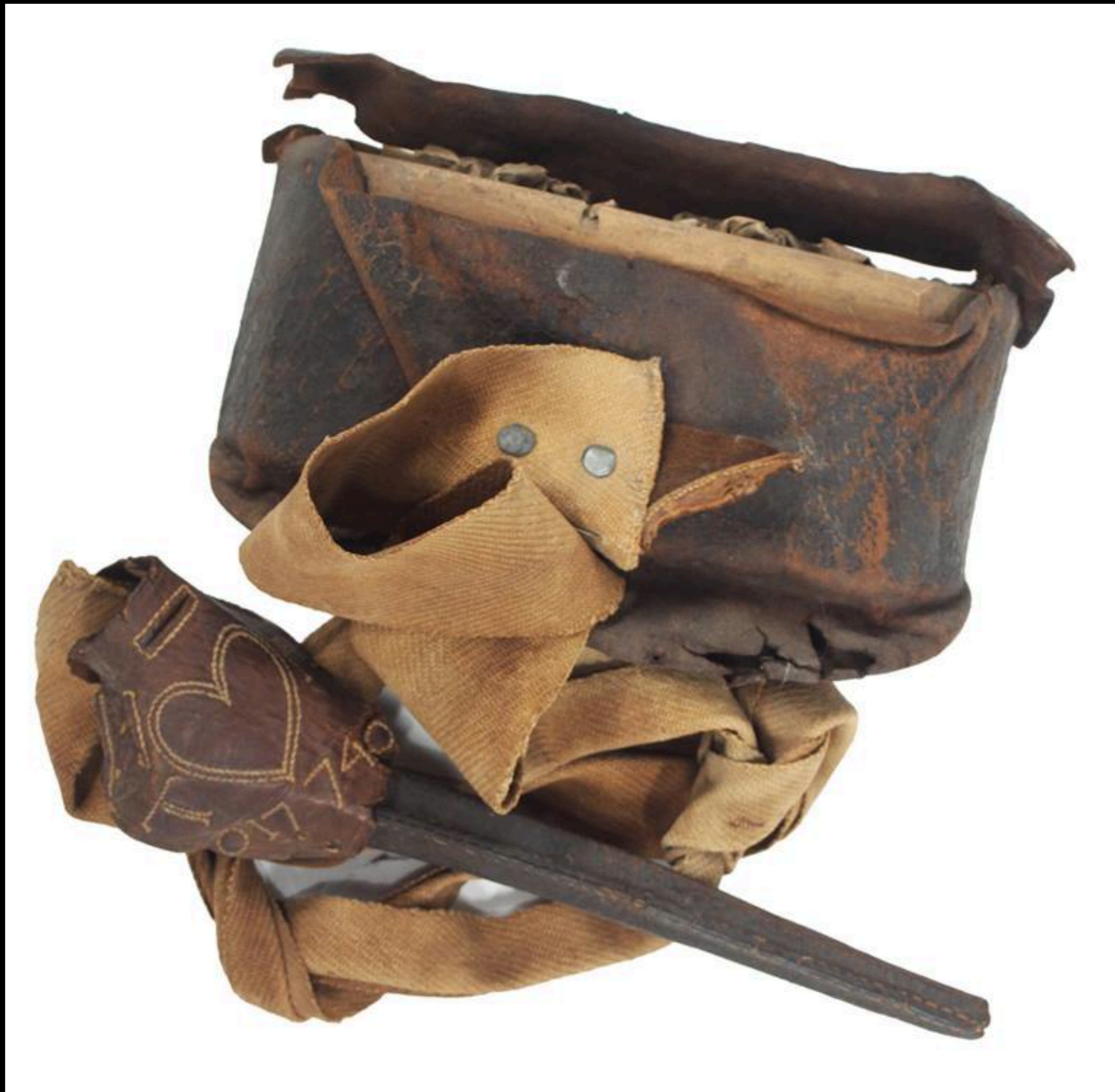
American Cartridge Pouch with Bayonet Scabbard & Frog from Connecticut Dated 1774