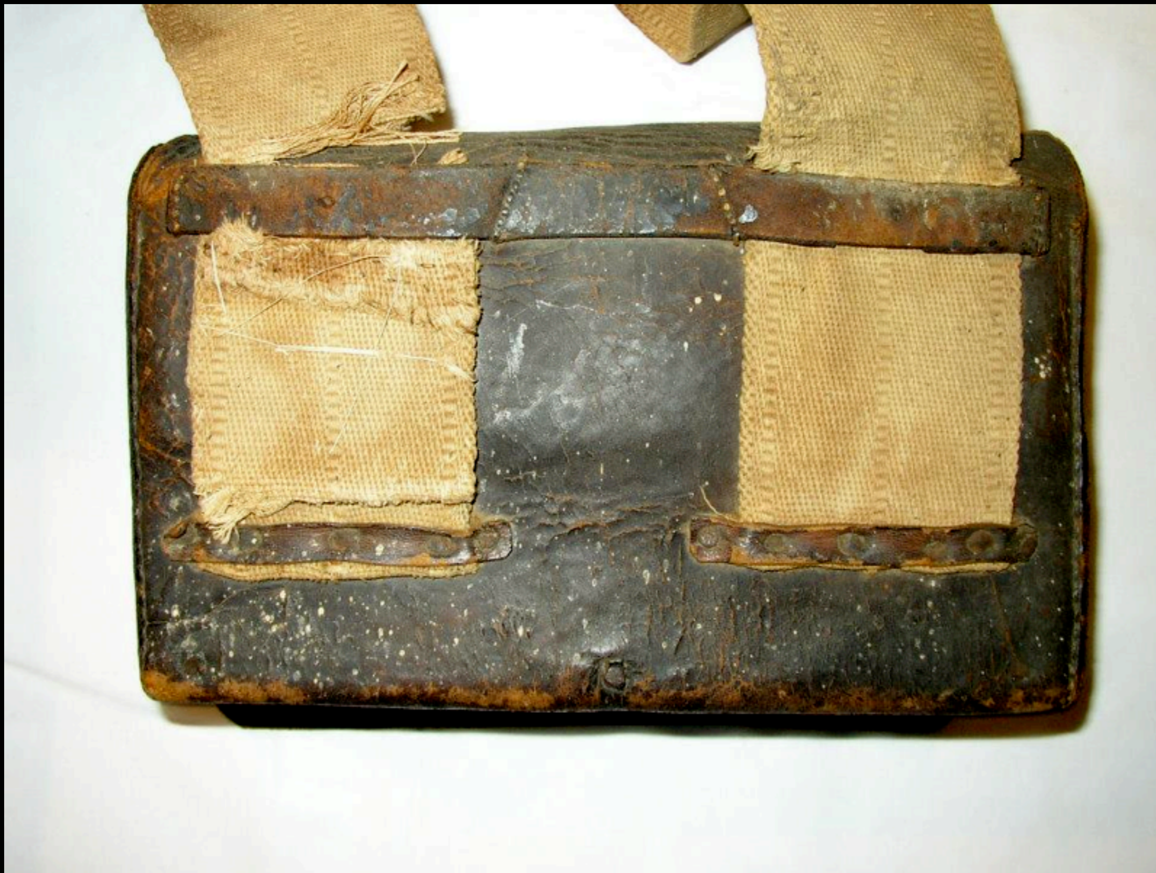
American Cartridge Pouch Tailored Bottom, Linen and Wool Shoulder Strap, Red Wool Heart on Flap. c. 1770 - 1800 (Private Collection)