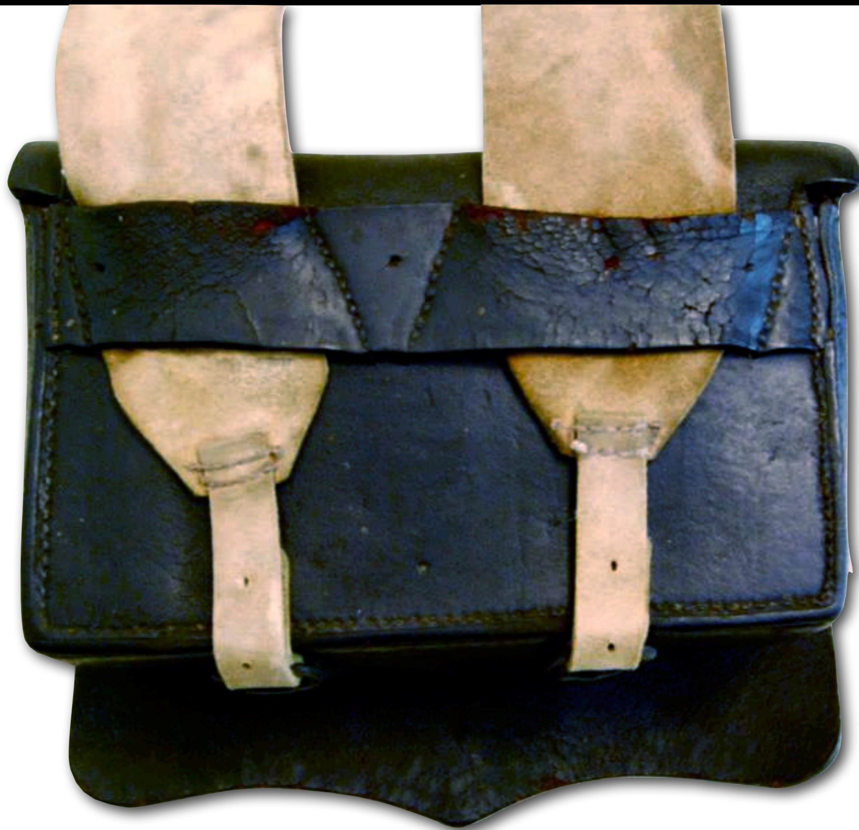
American Cartridge Pouch