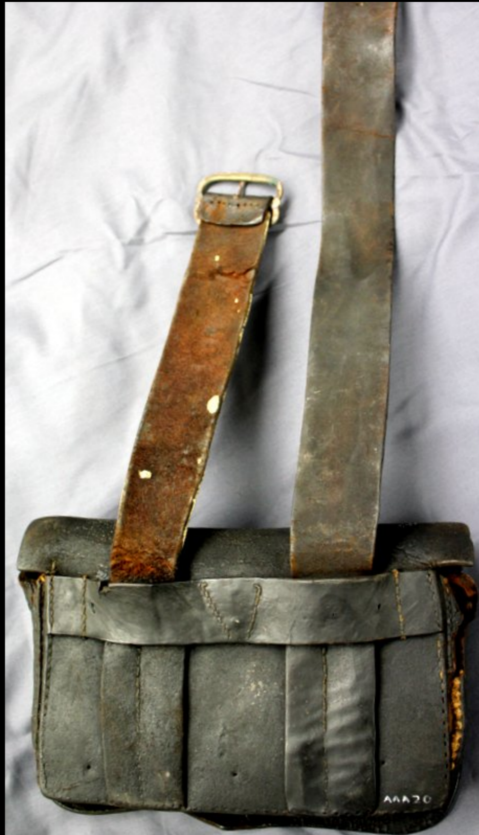
American New Invented Cartridge Pouch Stamped "U. STATES" with "American System" Closure (Don Troiani)