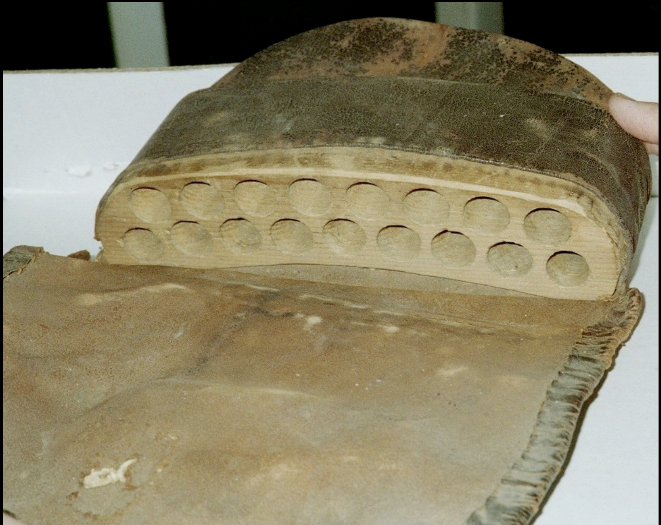
American 17 Round Cartridge Pouch from Massachusetts