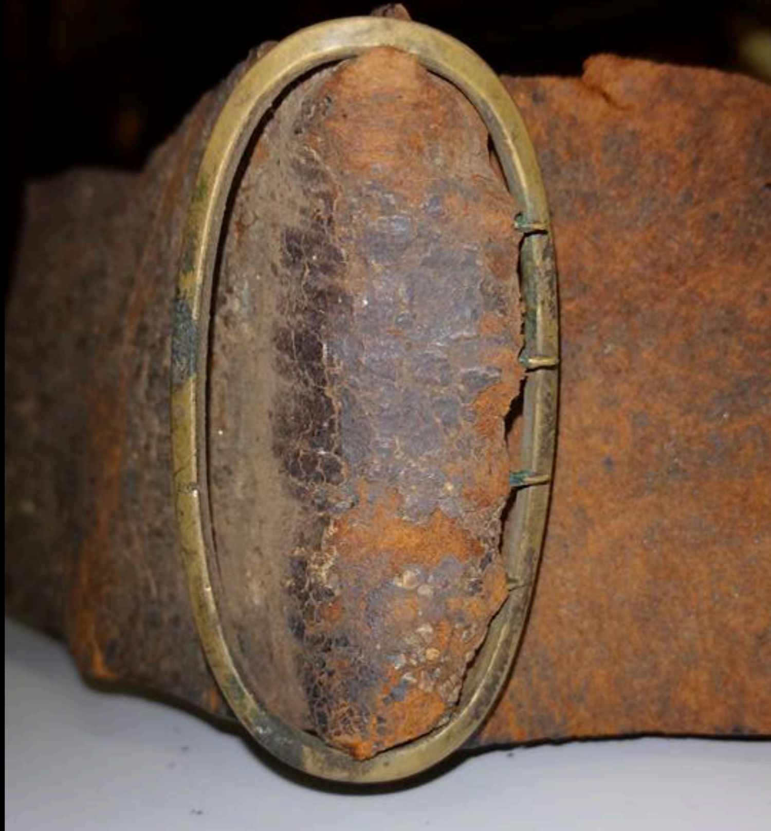
American 24 Round Cartridge Pouch Carried by Captain Oliver Buttick from Concord, Massachusetts c. 1776 (Private Collection)