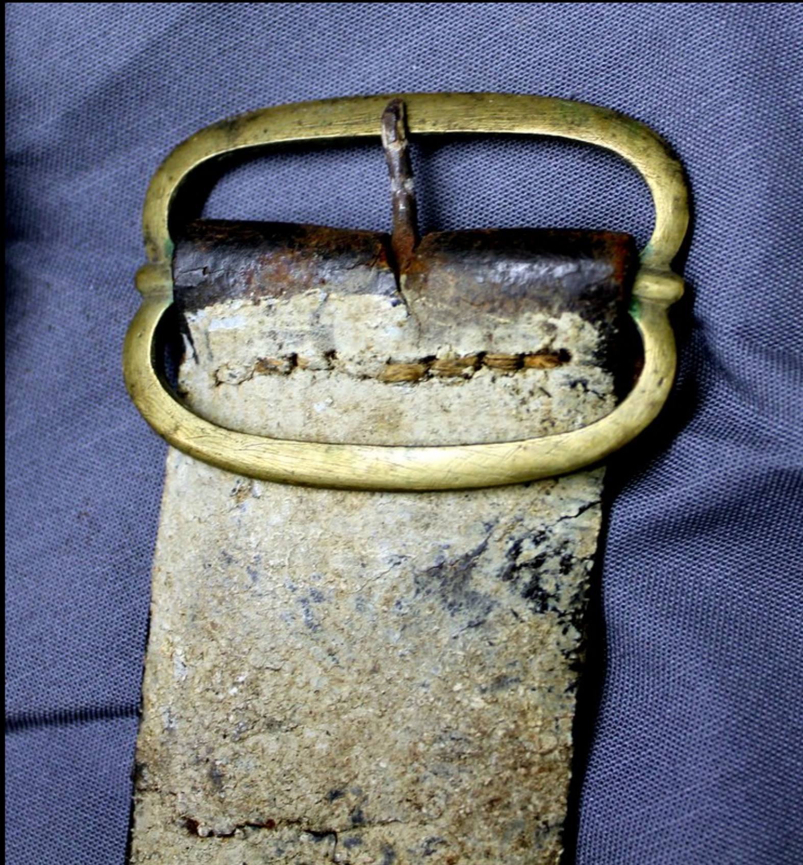
American New Invented Cartridge Pouch Stamped "U. STATES" with "American System" Closure (Don Troiani)