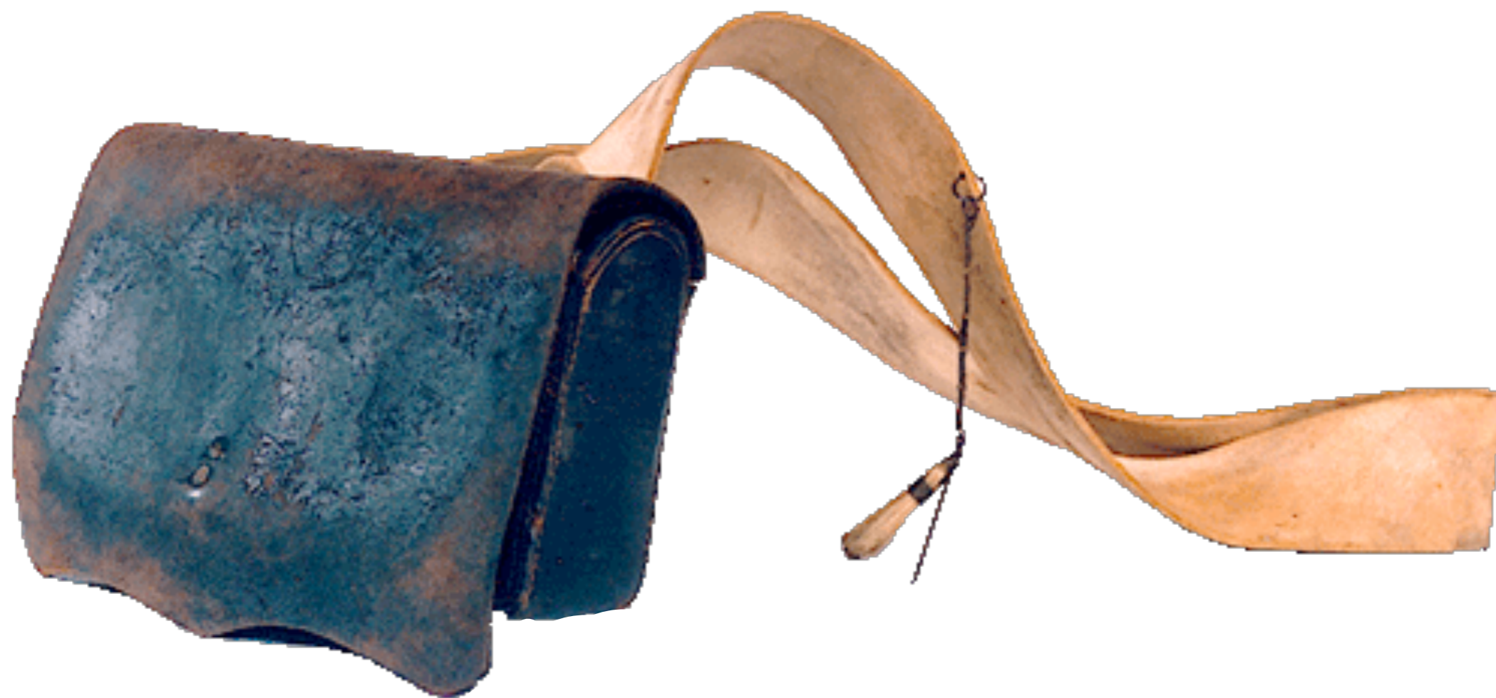
American Cartridge Pouch c. 1777