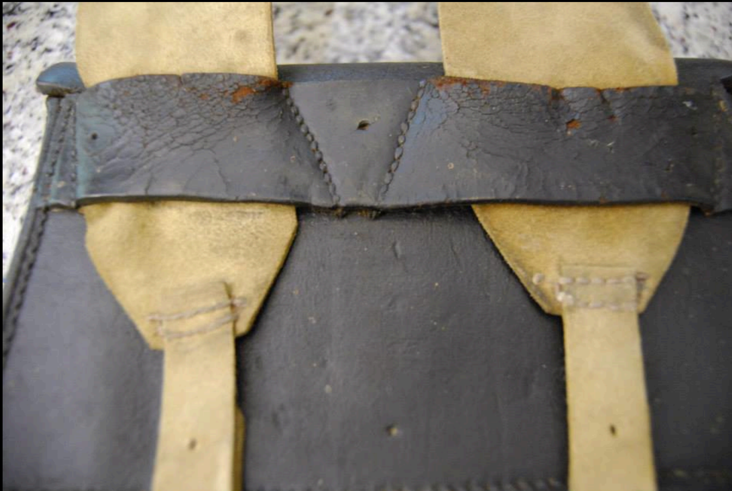
American Cartridge Pouch