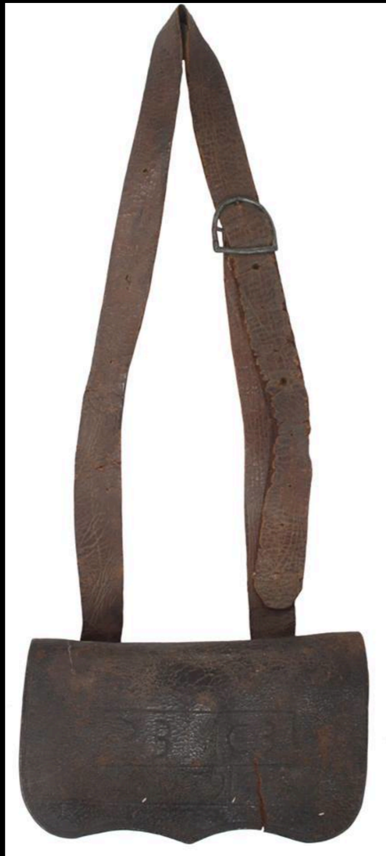
American Cartridge Pouch Dated 1779 (Don Troiani)