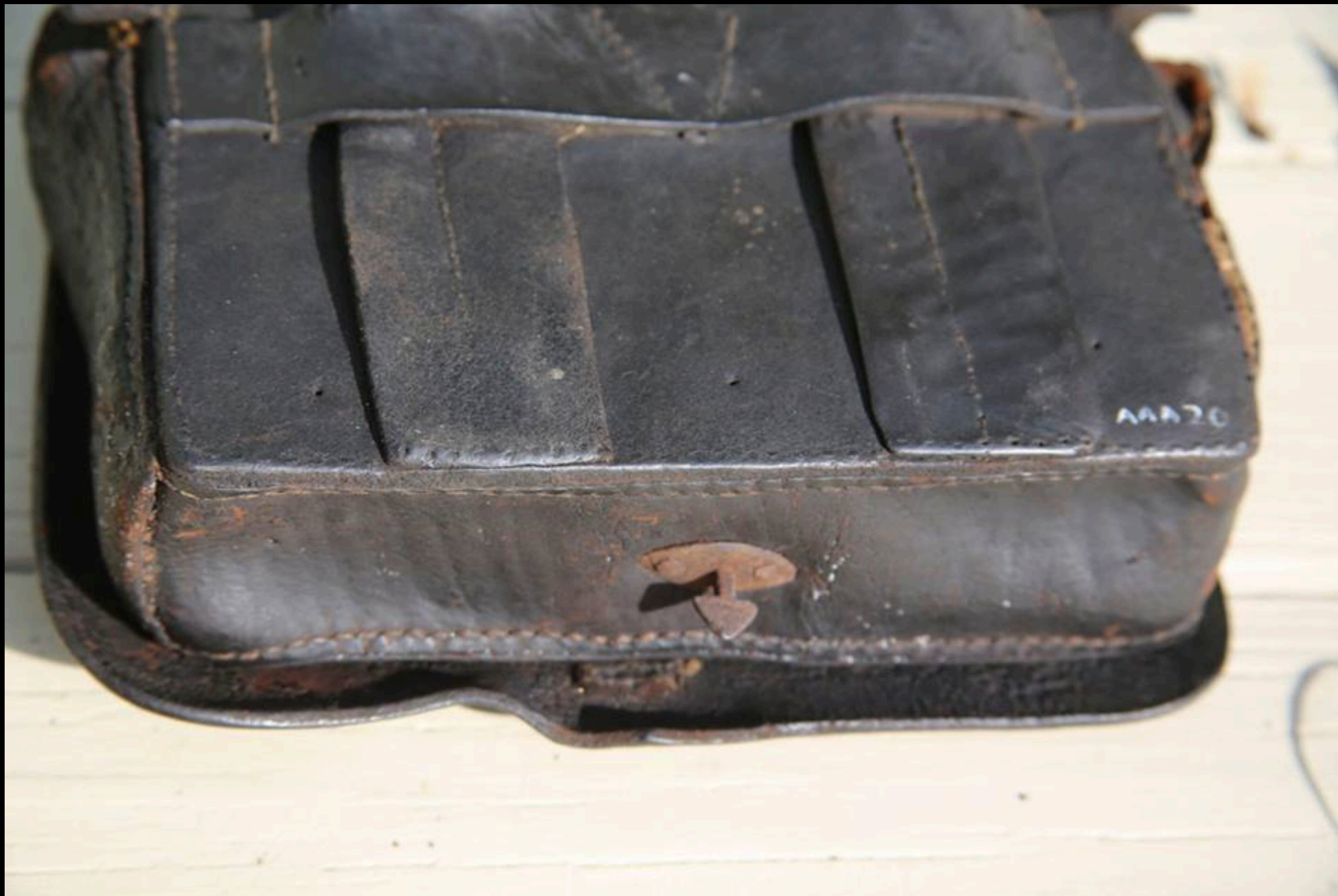
American New Invented Cartridge Pouch Stamped "U. STATES" with "American System" Closure (Don Troiani)