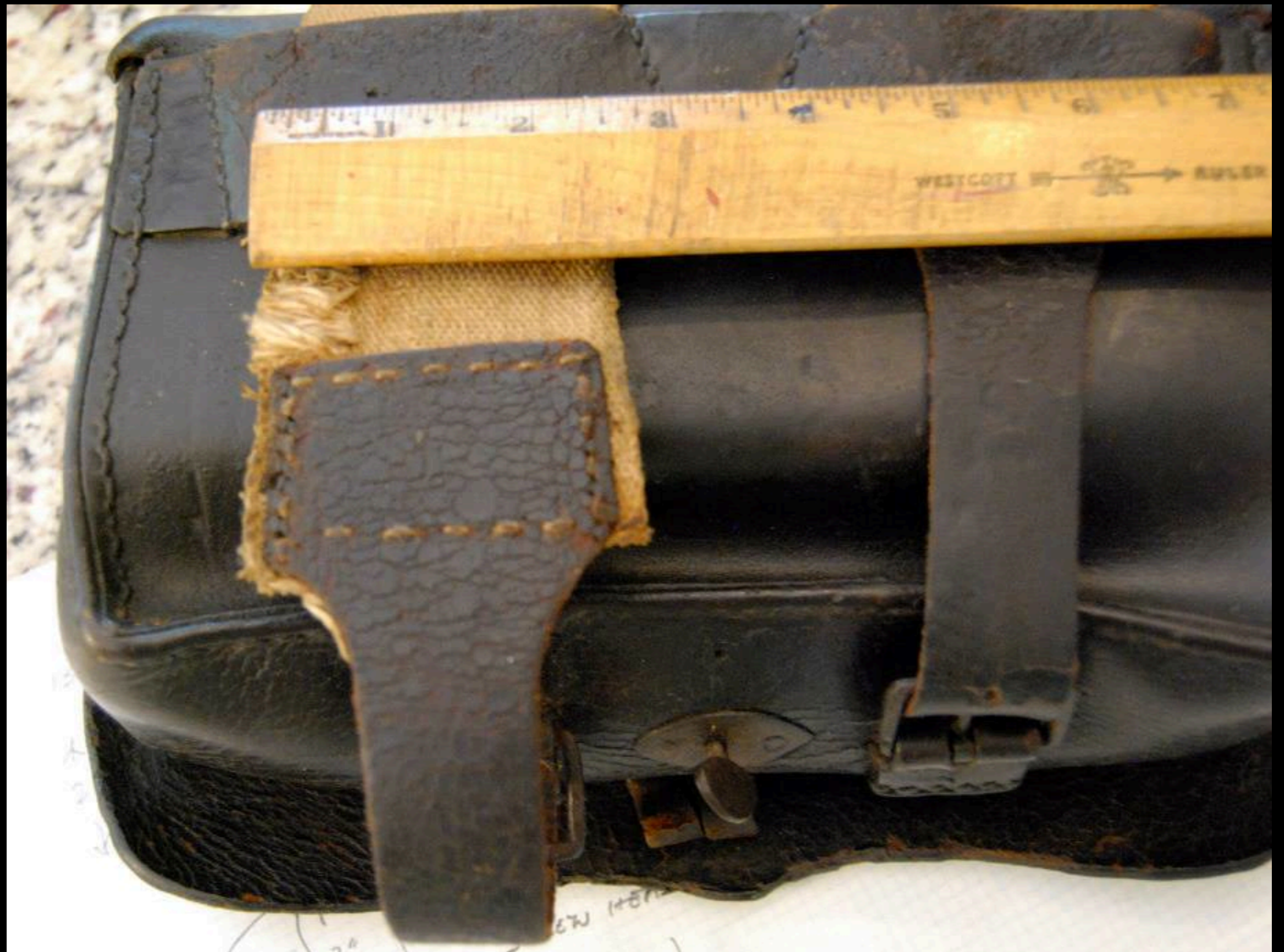
American 29 Round "New Model" Cartridge Pouch 18th Century

(Colonel J. Craig Nannos Collection - Photograph Courtesy Andrew Watson Kirk)