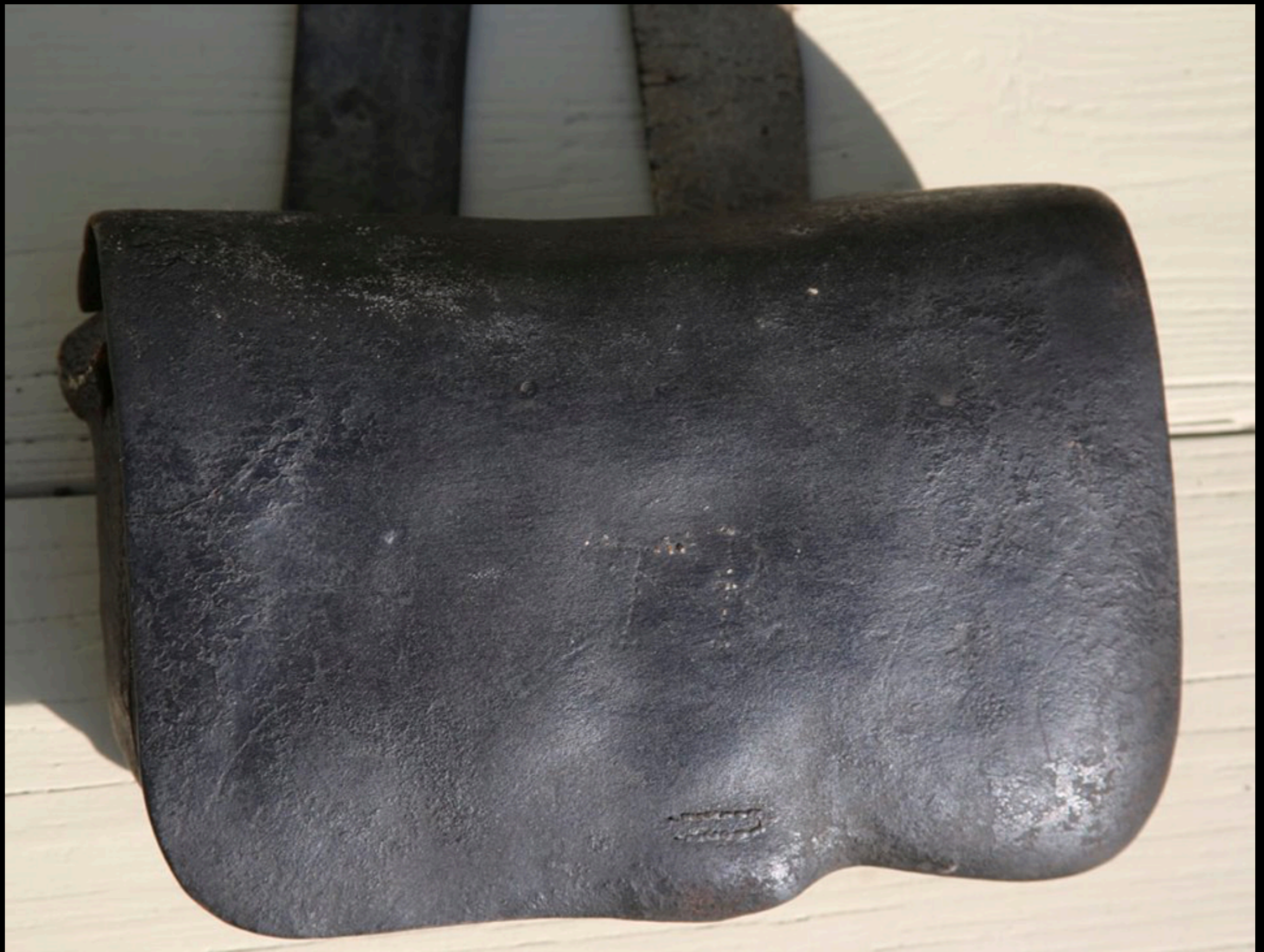
American New Invented Cartridge Pouch Stamped "U. STATES" with "American System" Closure (Don Troiani)