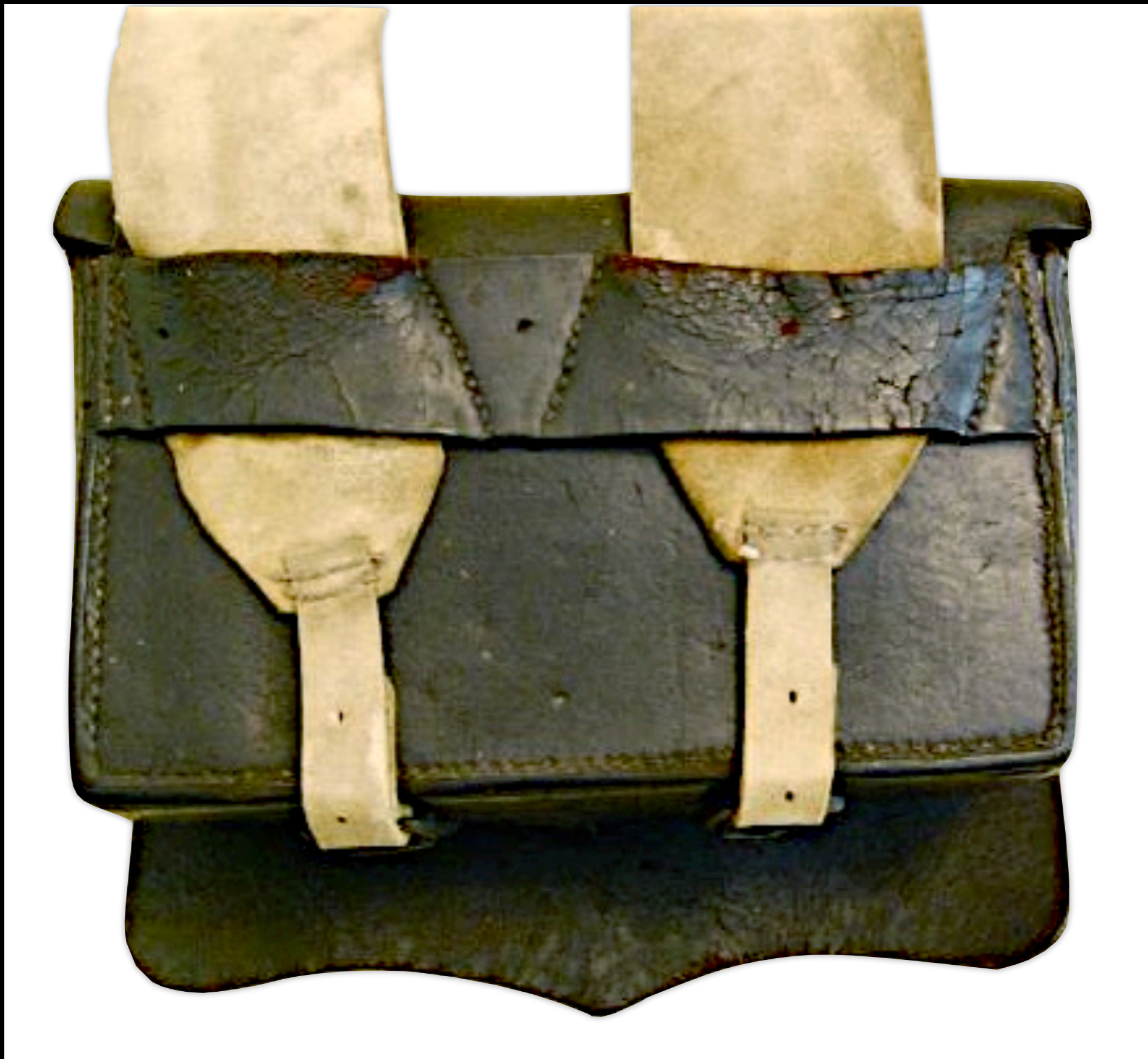
American 29 Round "New Model" Cartridge Pouch 18th Century