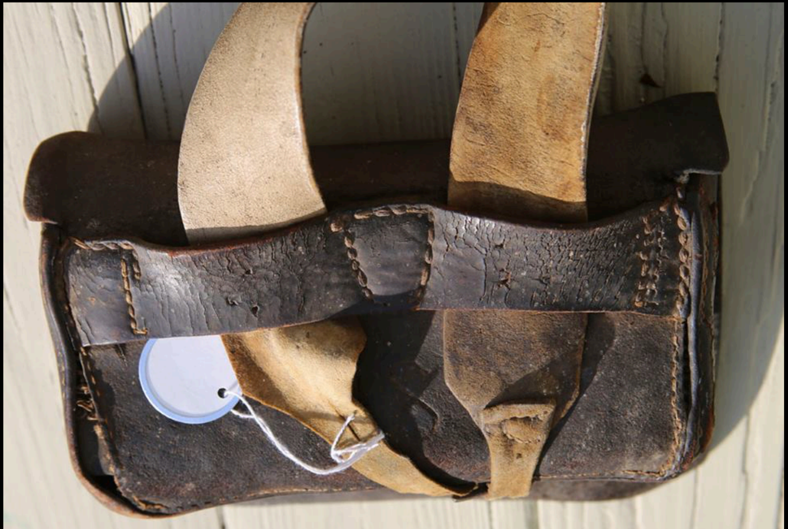
American New Model Cartridge Pouch of 1779 2nd Company - 6th Regiment - Possibly Connecticut (Don Troiani)