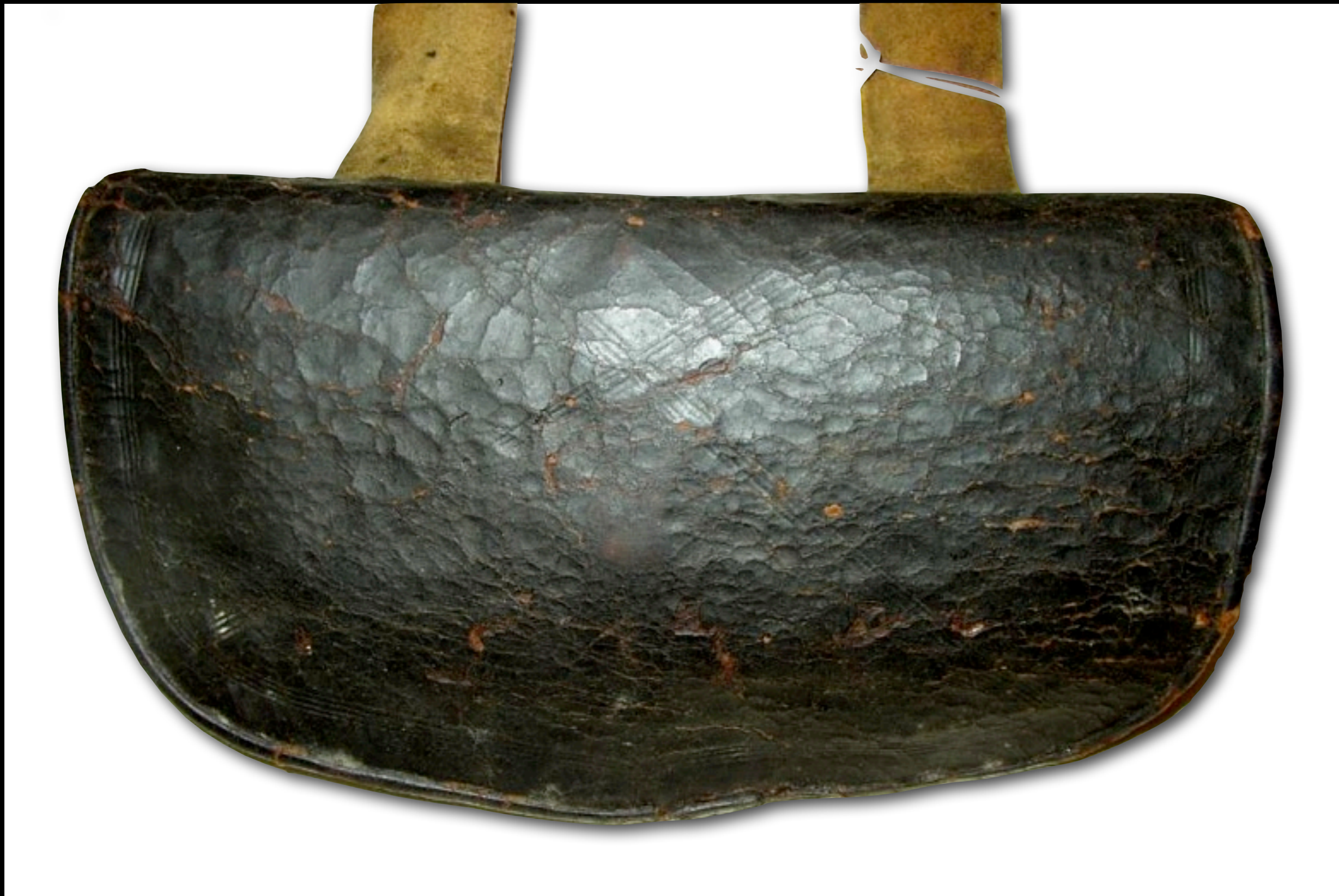
American 17 Round Cartridge Pouch 18th Century (Private Collection)