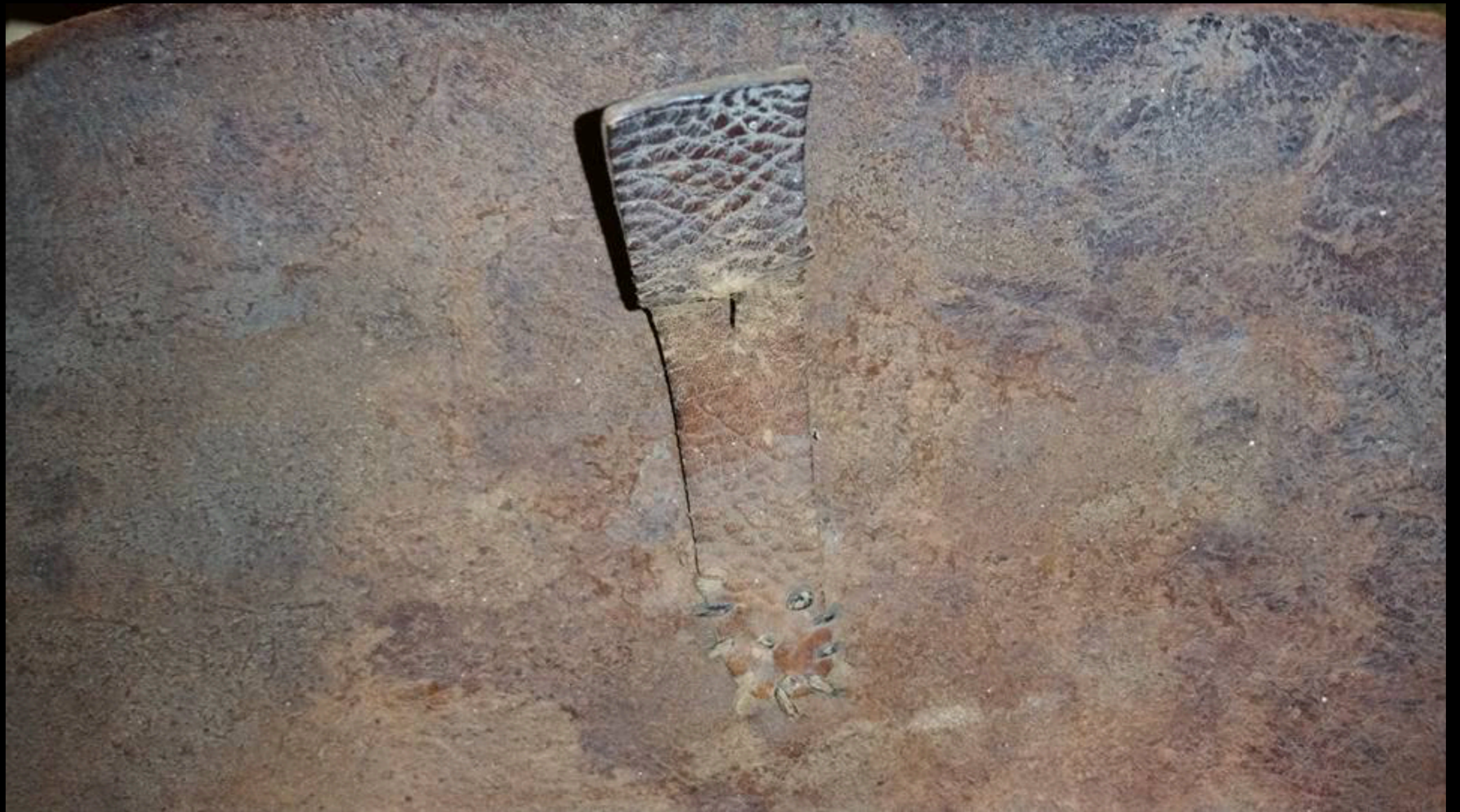
American 24 Round Cartridge Pouch Carried by Captain Oliver Buttick from Concord, Massachusetts c. 1776 (Private Collection)