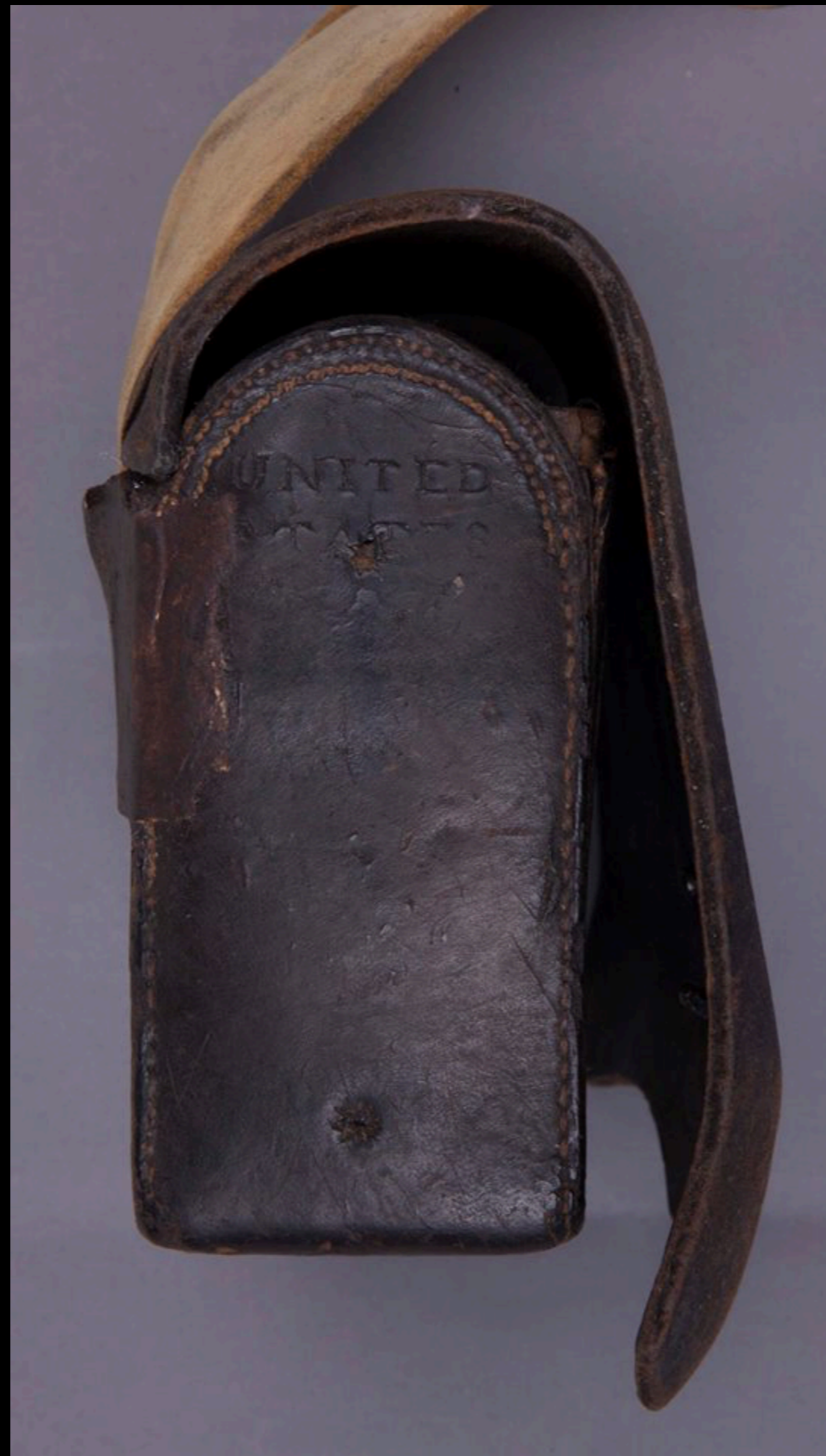
American New Invented Cartridge Pouch Stamped "UNITED STATES" and "W. HAWES" (Inspector at Springfield Arsenal) with "British System" Closure (U.S. Army Center of Military History / Former Colonel J. Craig Nannos Collection / Photos Courtesy Don Troiani)