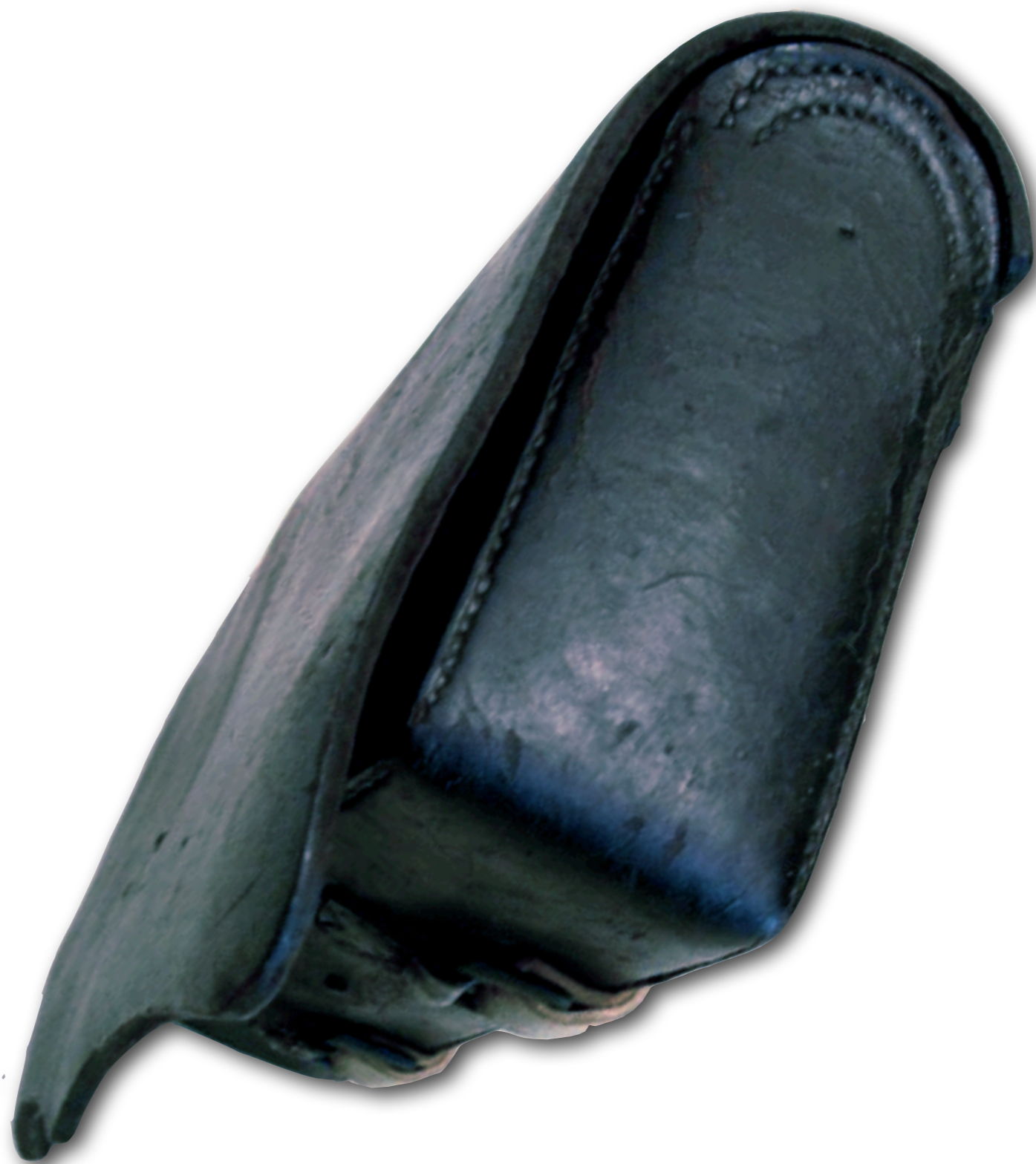
American Cartridge Pouch