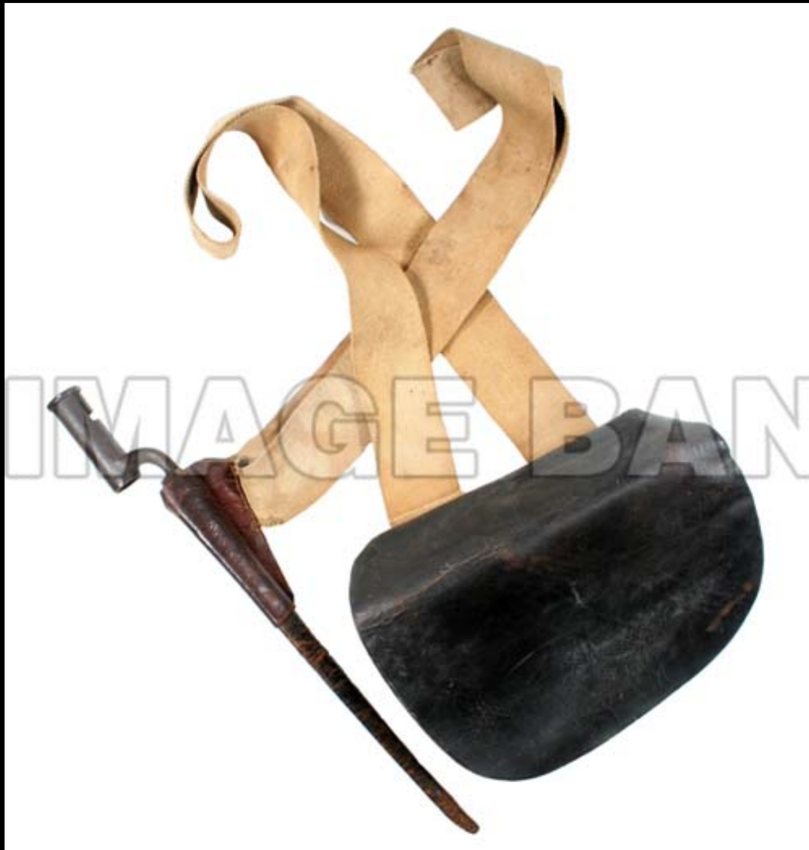
American Cartridge Pouch & Bayonet Carriage 18th Century (Don Troiani)