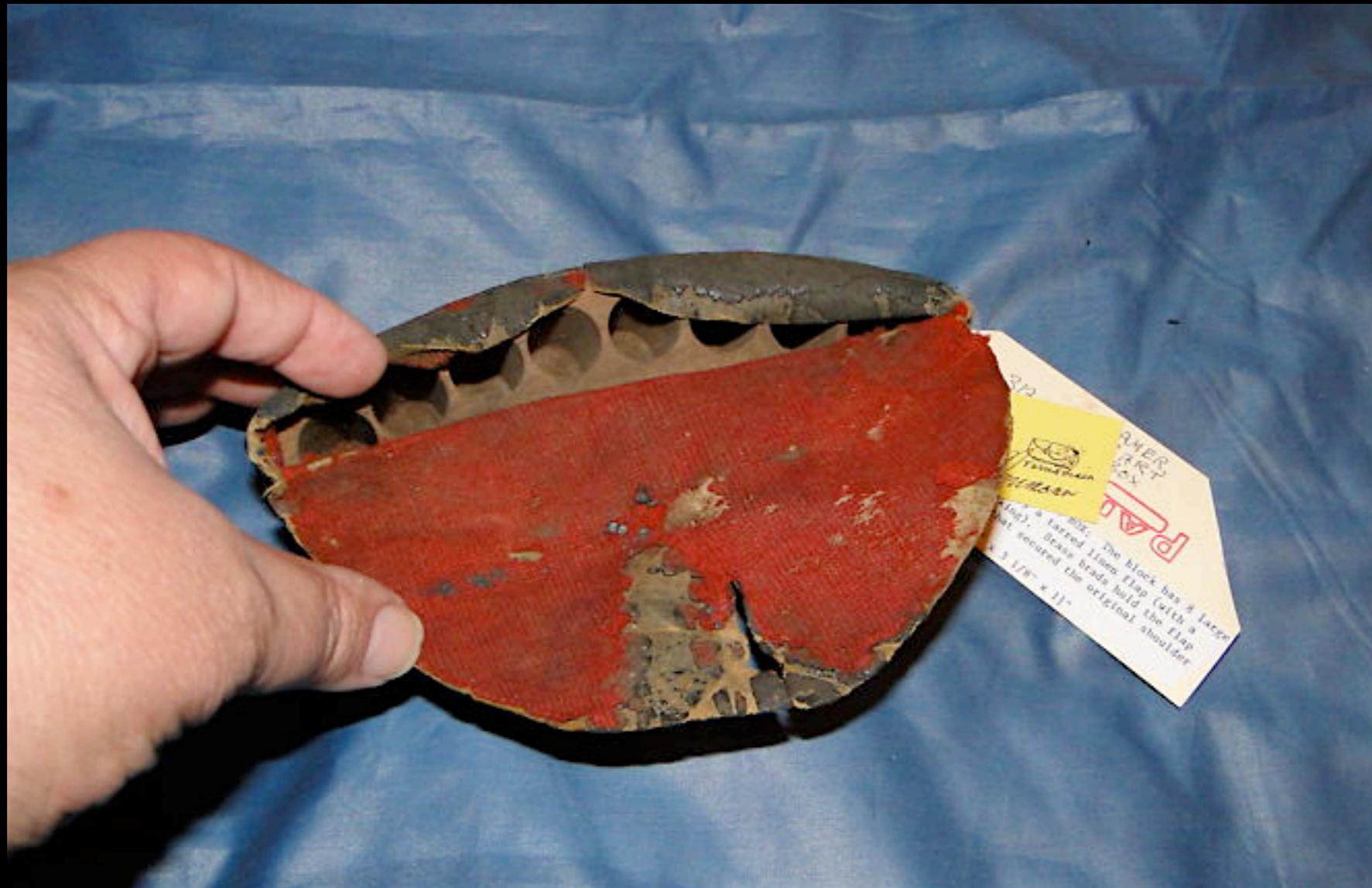
American 8 Round Tarred Linen Cartridge Box 18th Century (Formerly George Neuman Collection)