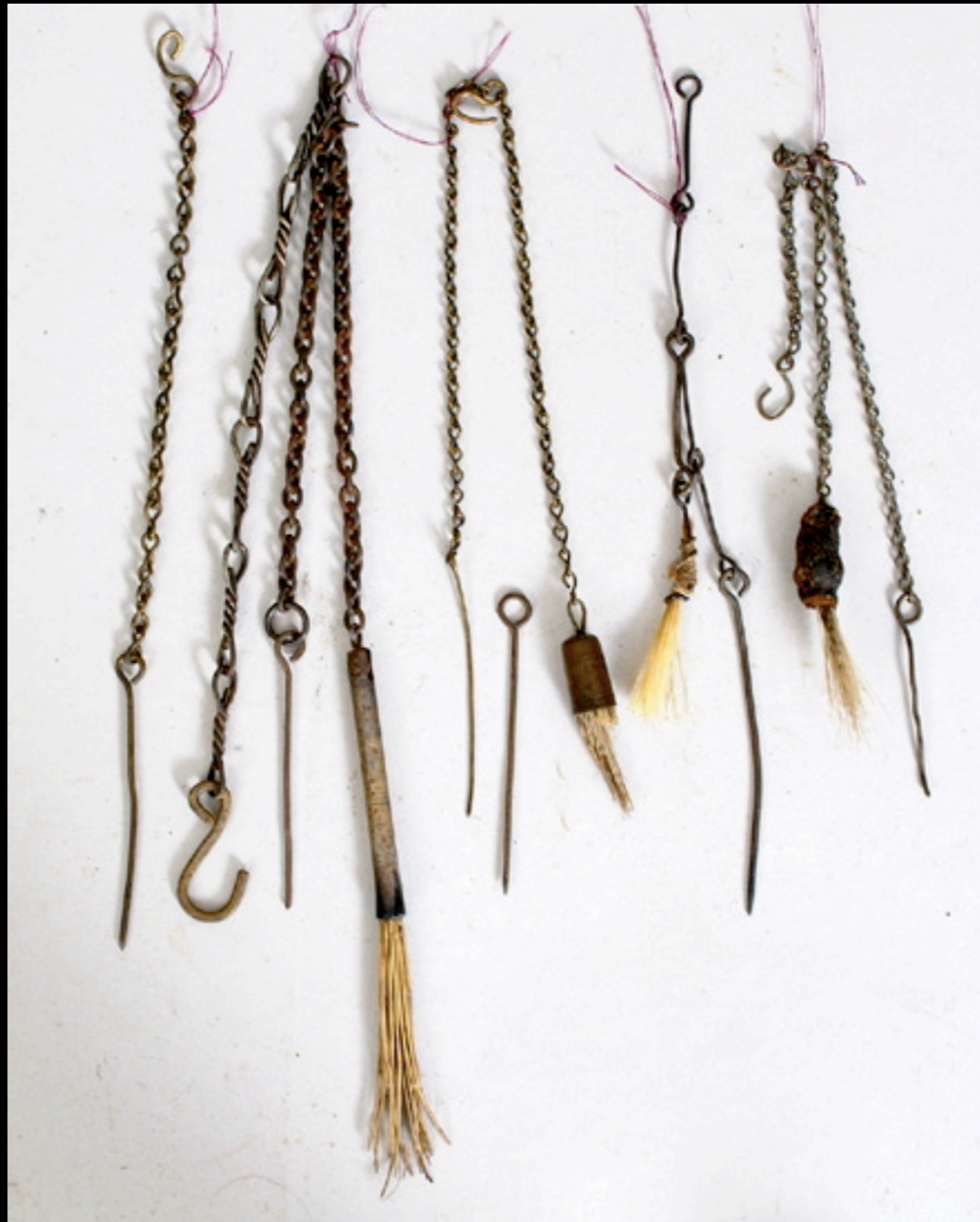
Picks & Whisks 18th Century (Estate of Tom Wnuck)