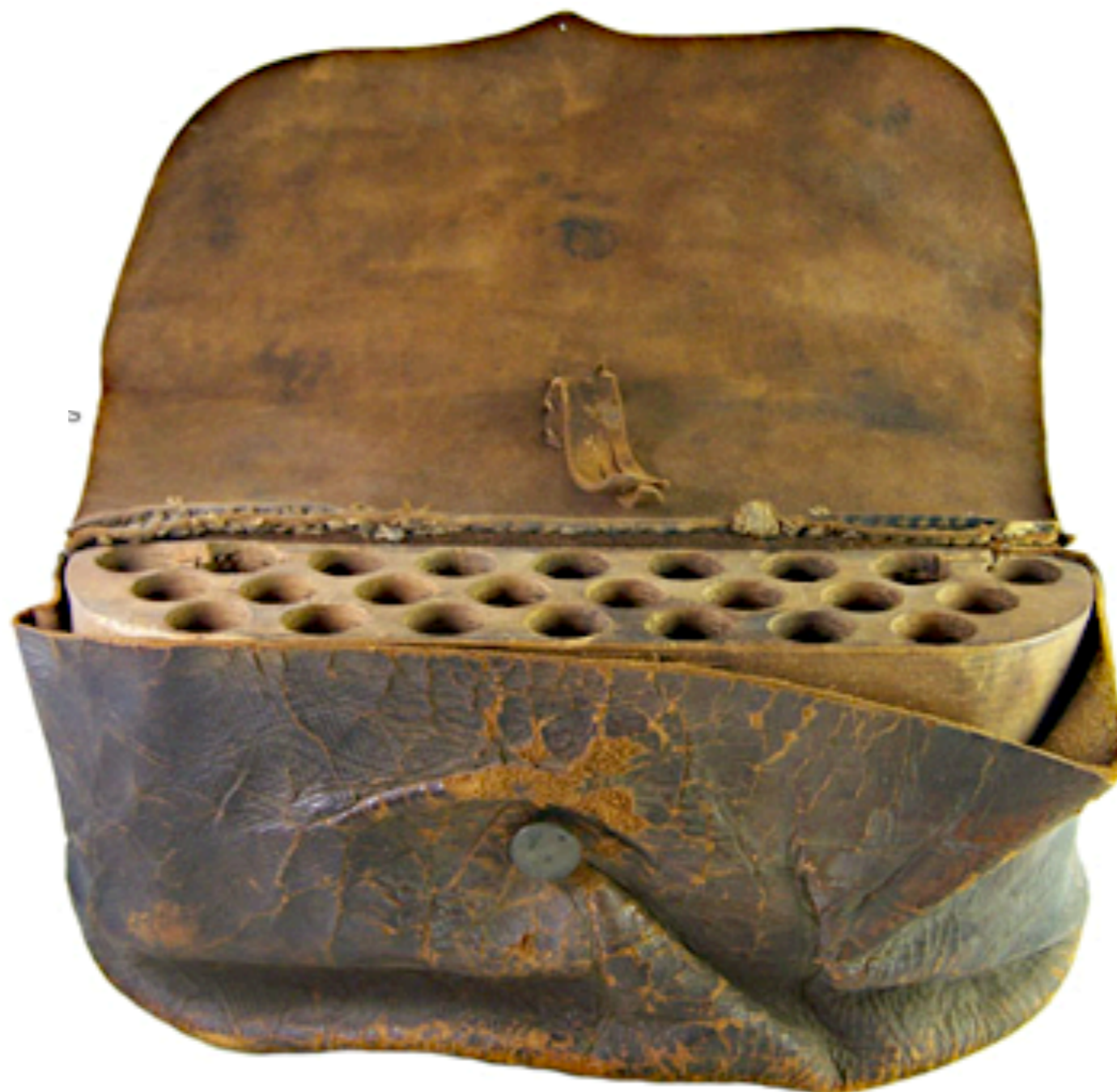
American 24 Round Cartridge Pouch