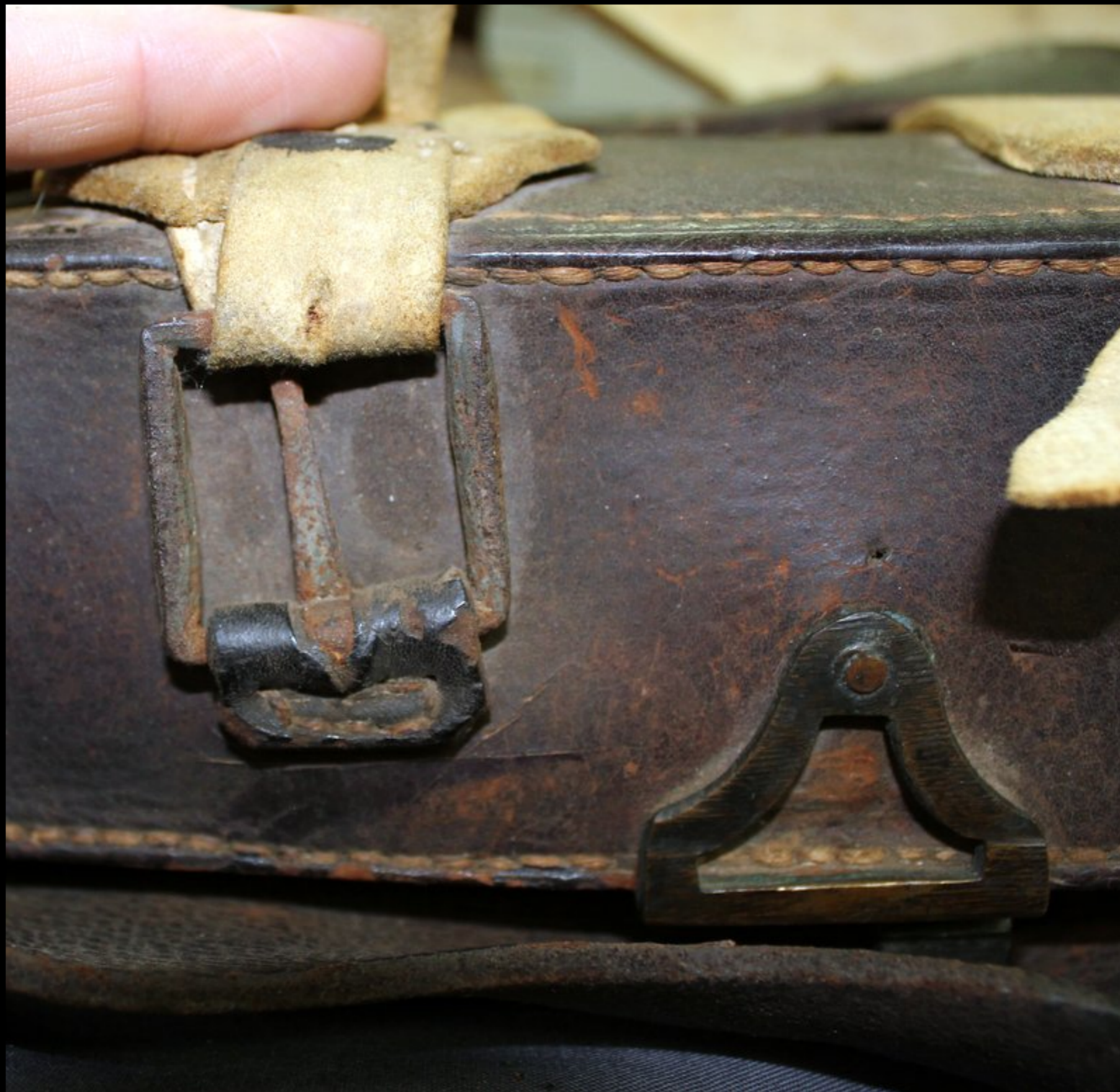
American Pouch Similar to the "British System" Pouch 18th Century (Don Troiani)