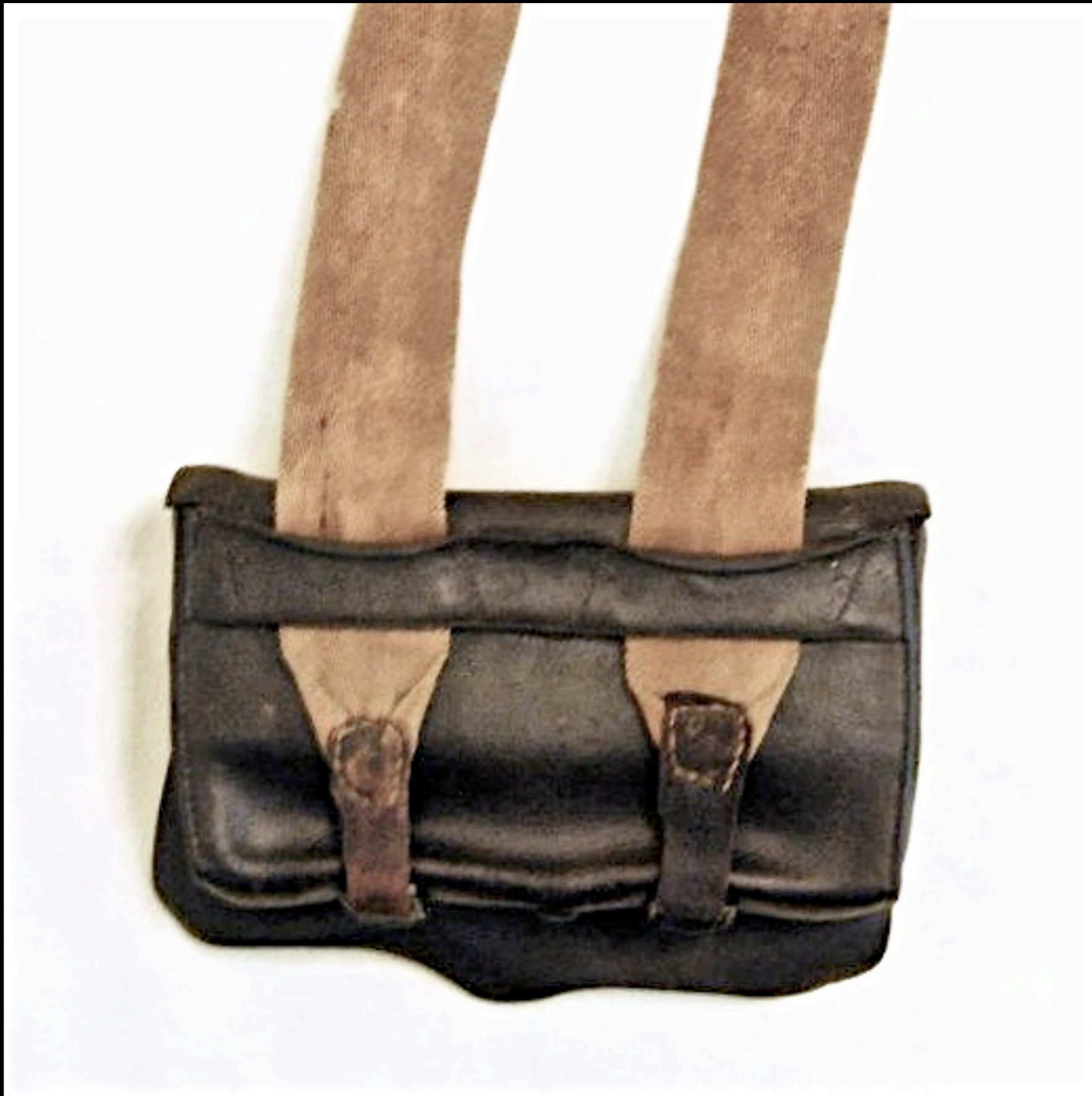
American 20 Round Cartridge Pouch