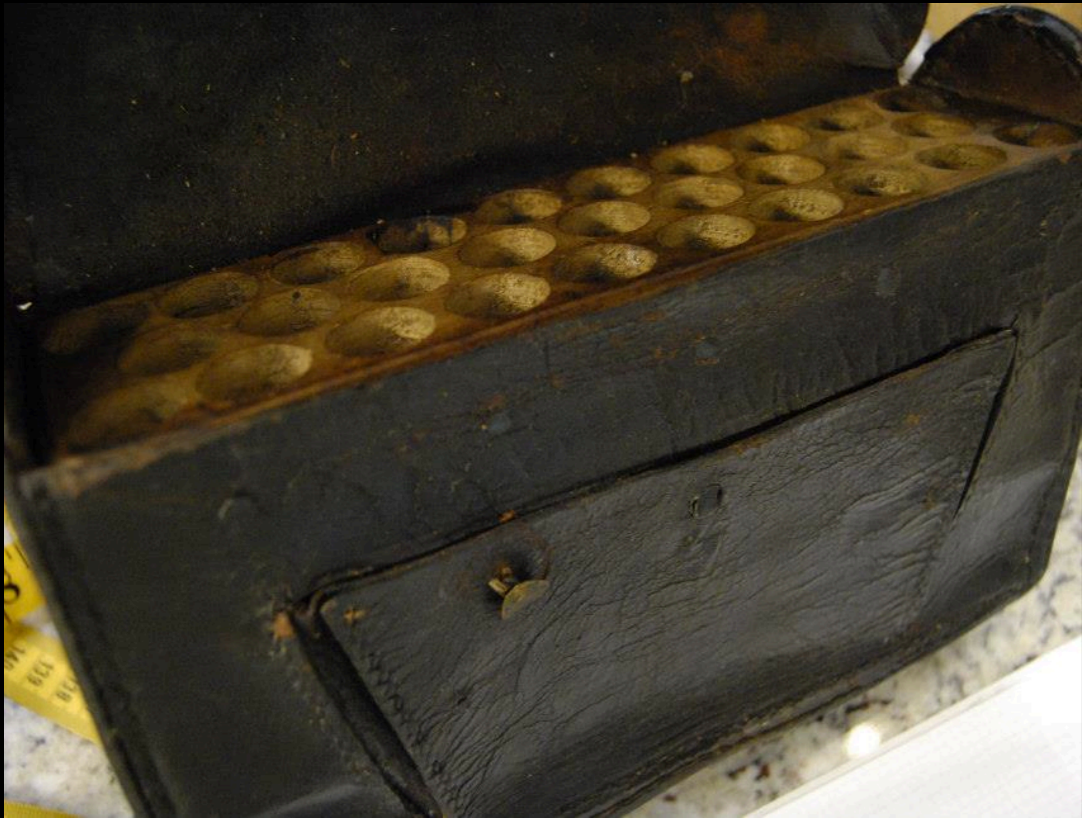
American 29 Round "New Model" Cartridge Pouch 18th Century