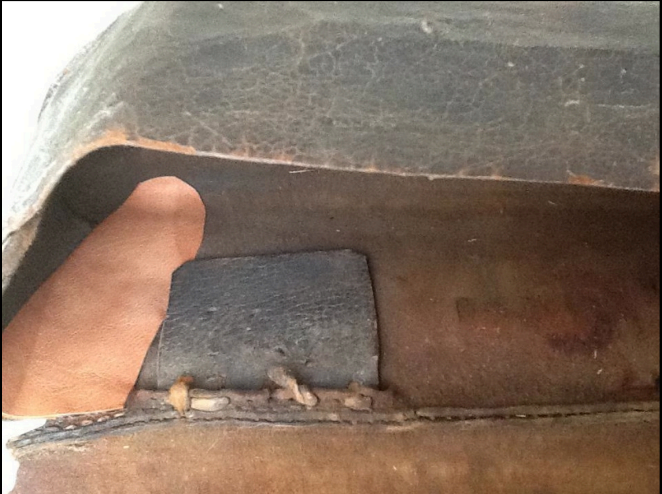
American 17 Round Cartridge Pouch with 7 Round Block Addition 18th Century (Private Collection)