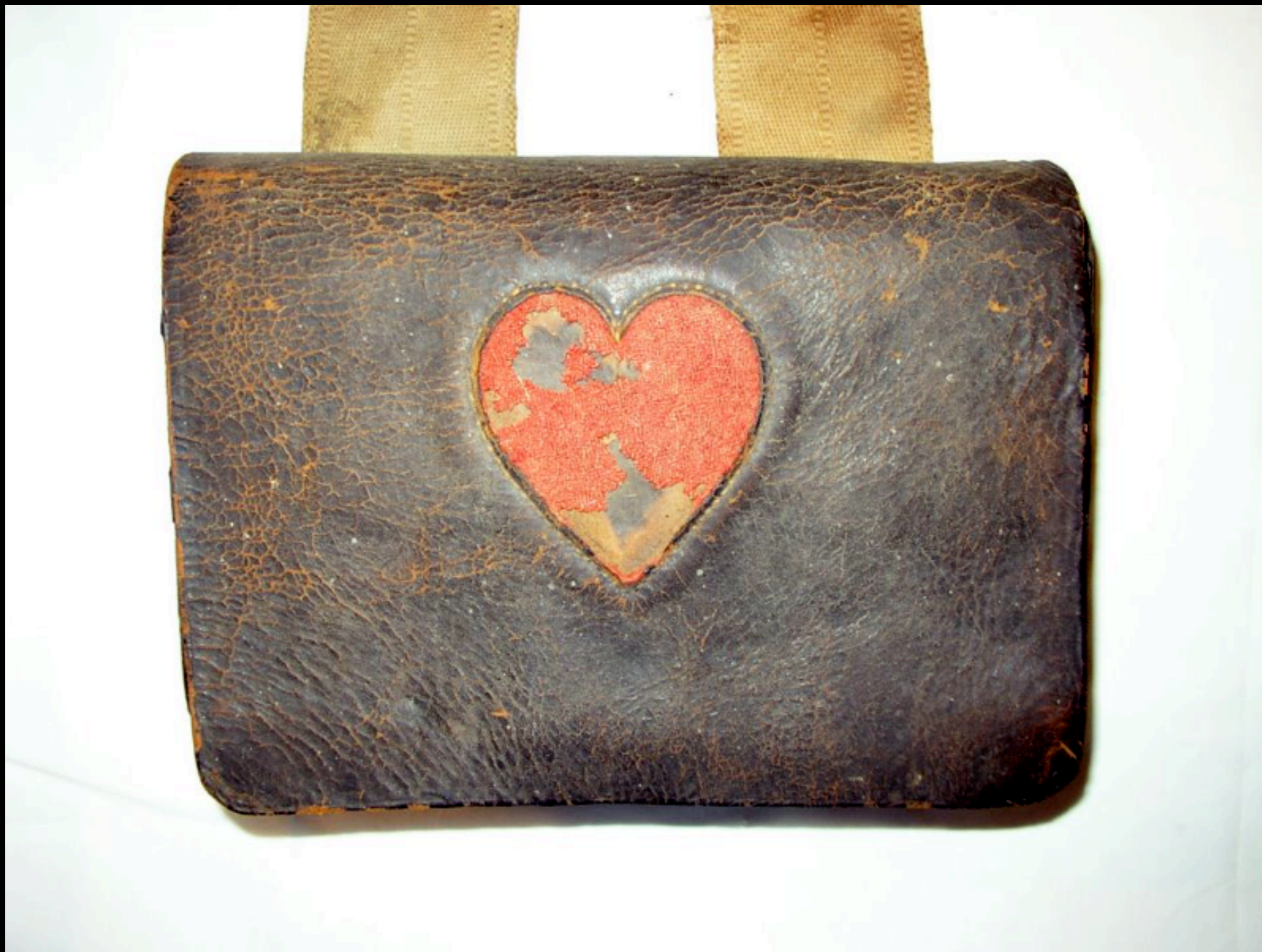
American Cartridge Pouch Tailored Bottom, Linen and Wool Shoulder Strap, Red Wool Heart on Flap. c. 1770 - 1800 (Private Collection)