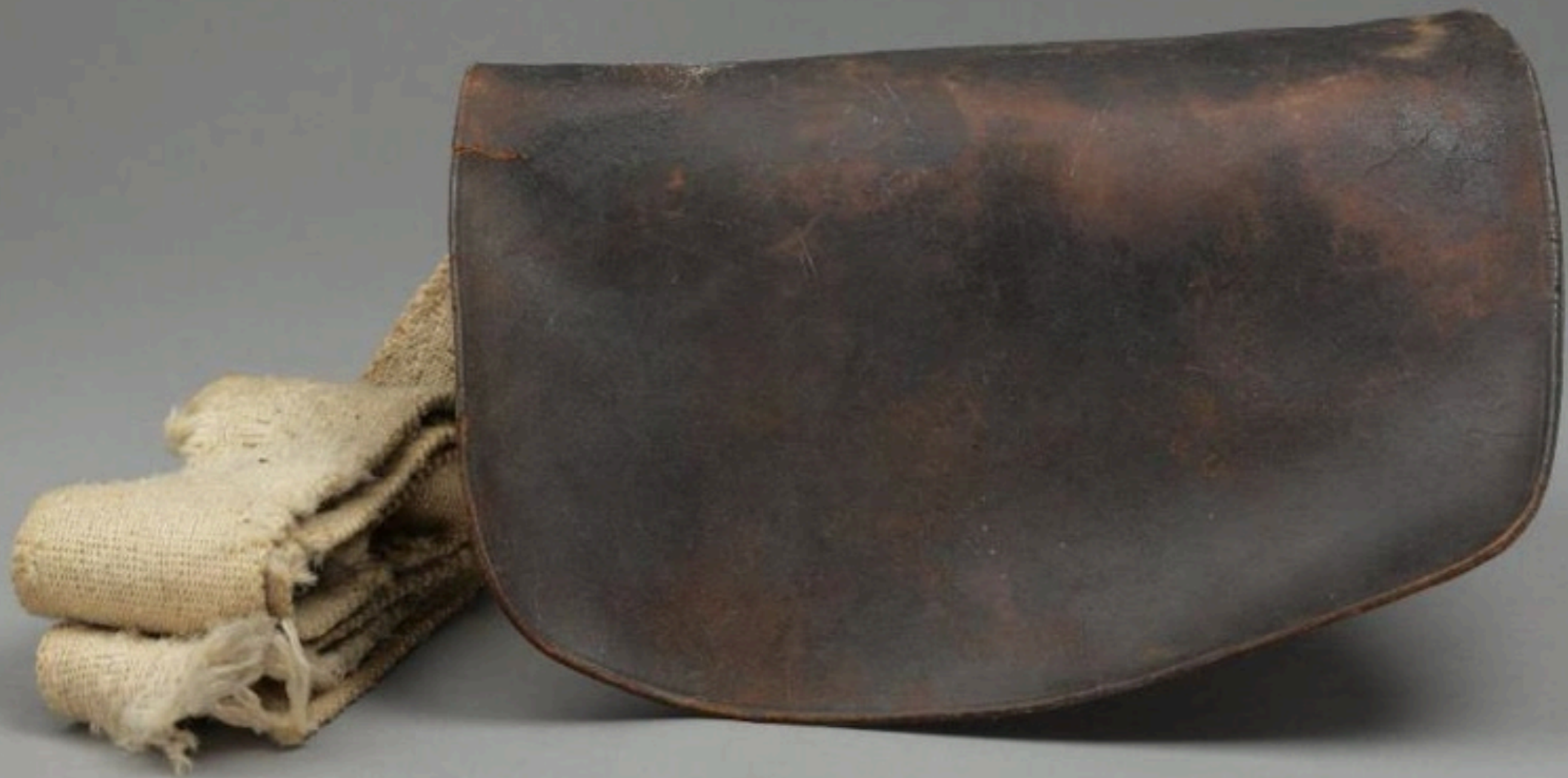
American 24 Round Cartridge Pouch 18th Century (Private Collection)