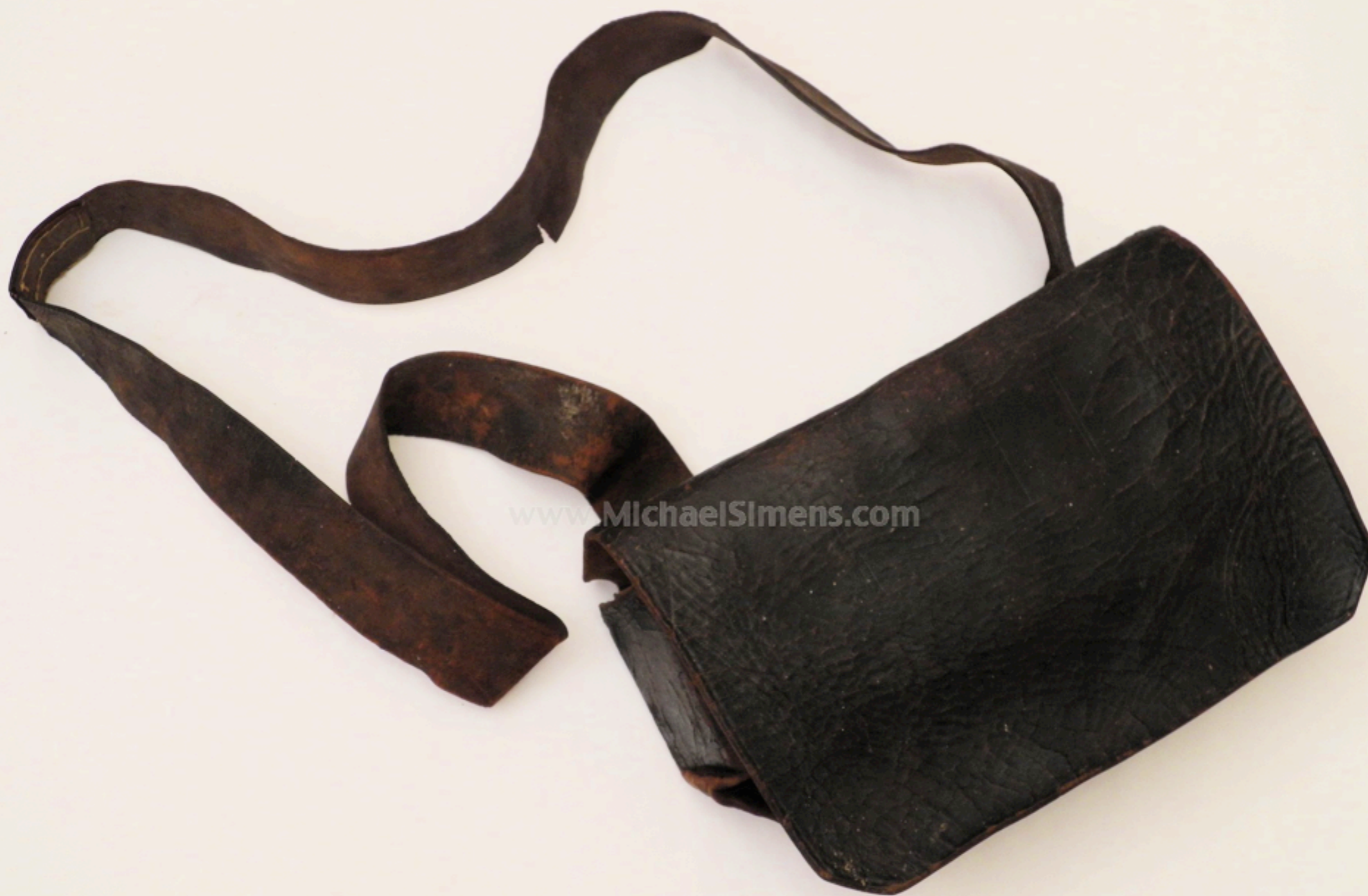
American 24 Round Cartridge Pouch 18th Century