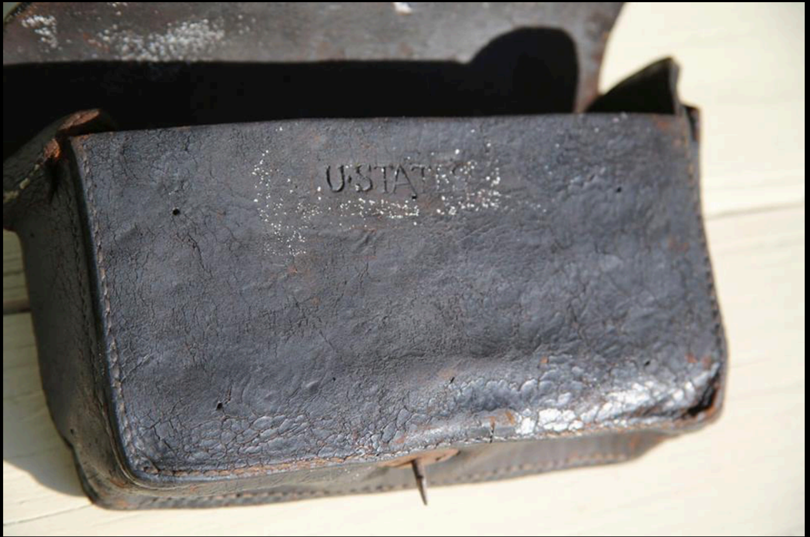
American New Invented Cartridge Pouch Stamped "U. STATES" with "American System" Closure (Don Troiani)