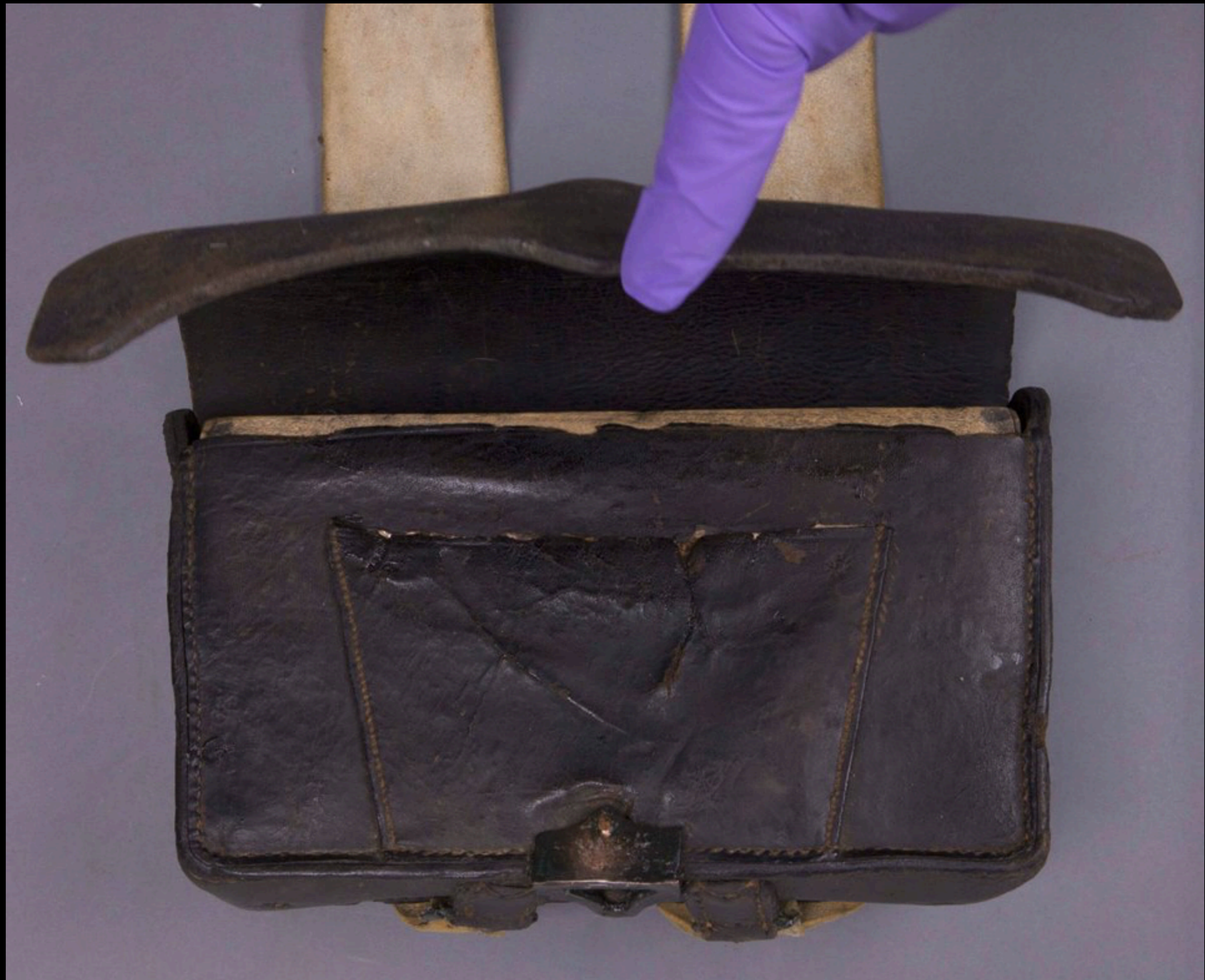
American New Invented Cartridge Pouch Stamped "UNITED STATES" and "W. HAWES" (Inspector at Springfield Arsenal) with "British System" Closure (U.S. Army Center of Military History / Former Colonel J. Craig Nannos Collection / Photos Courtesy Don Troiani)