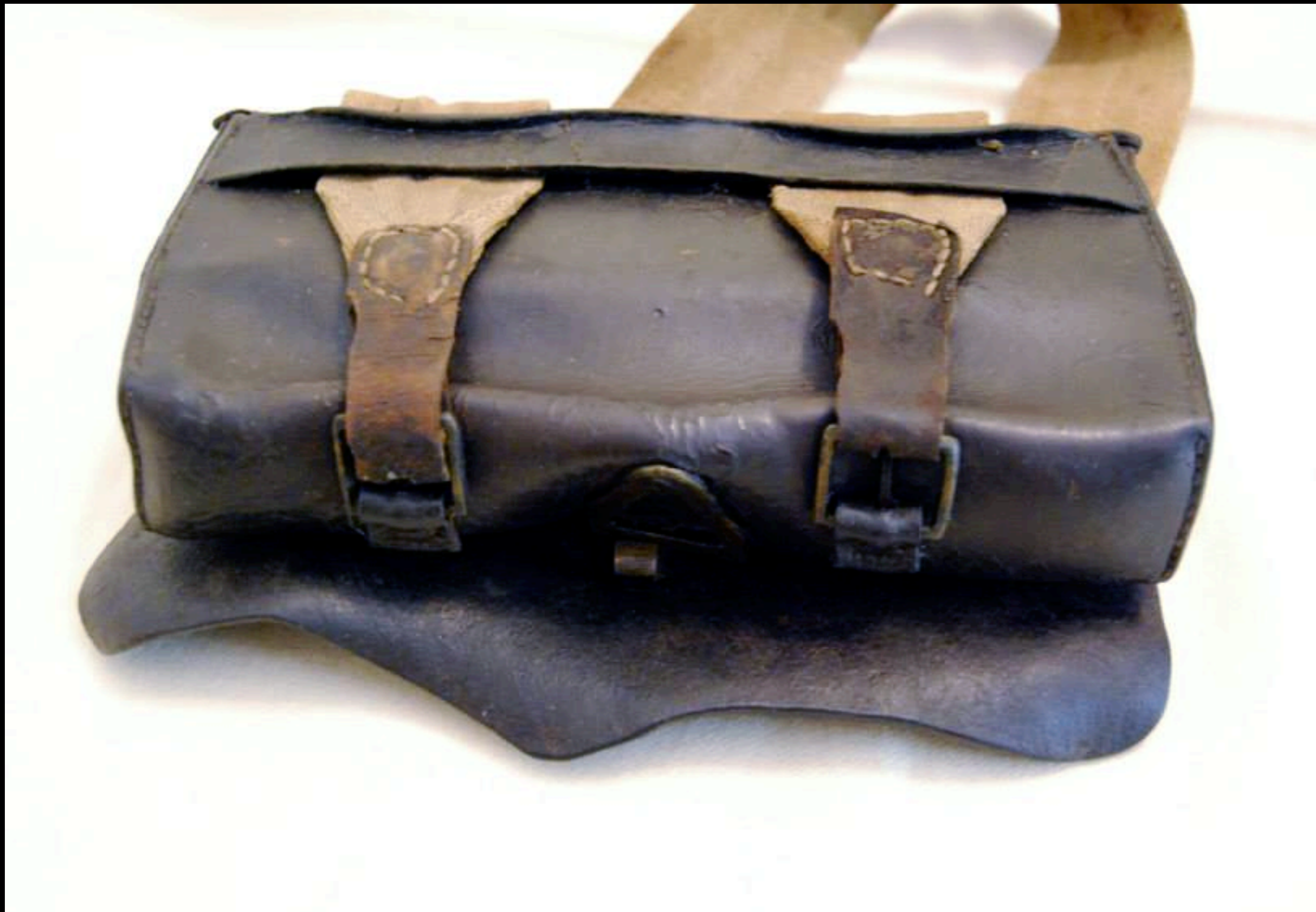
American 20 Round Cartridge Pouch