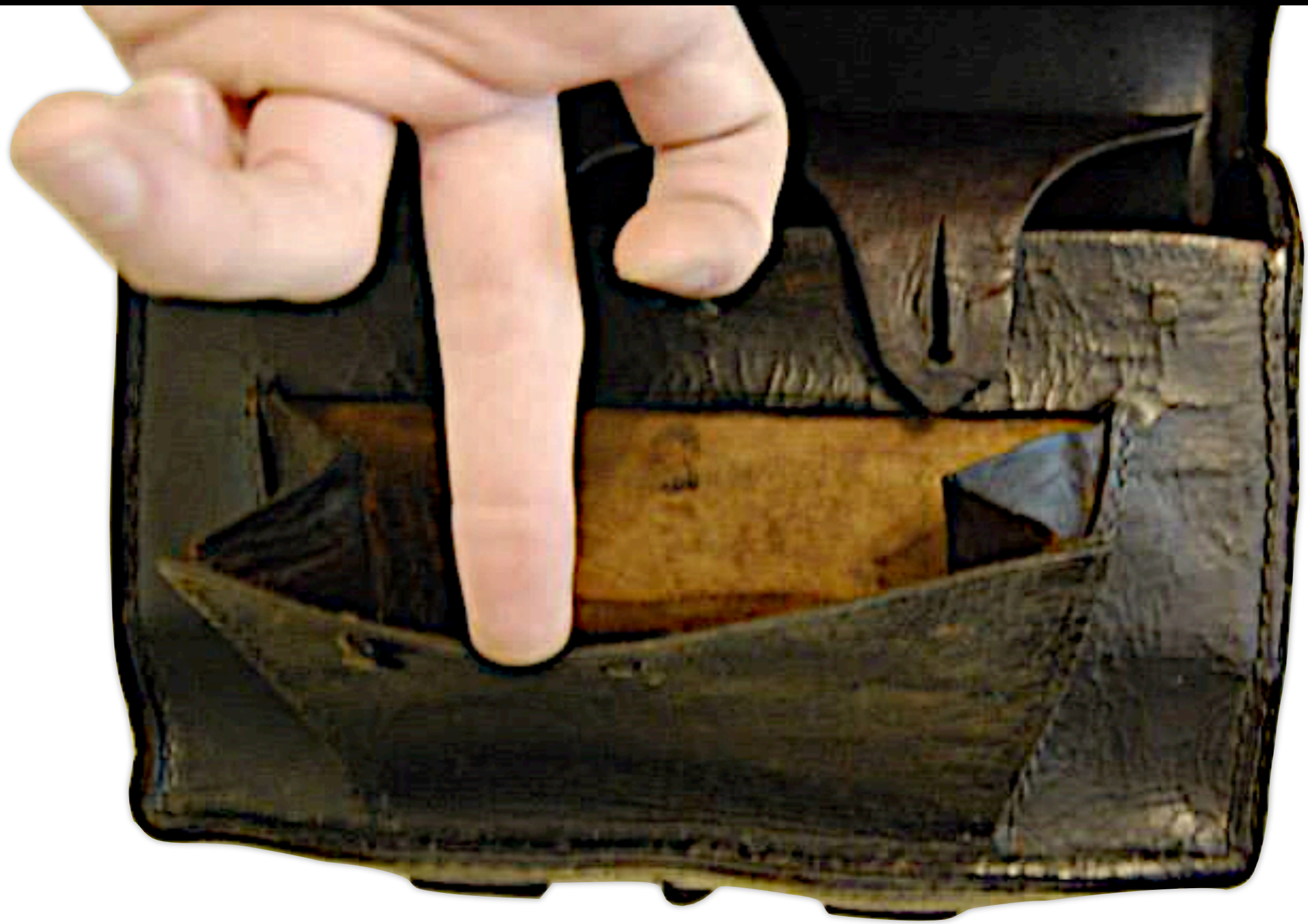
American 29 Round "New Model" Cartridge Pouch 18th Century

(Colonel J. Craig Nannos Collection)