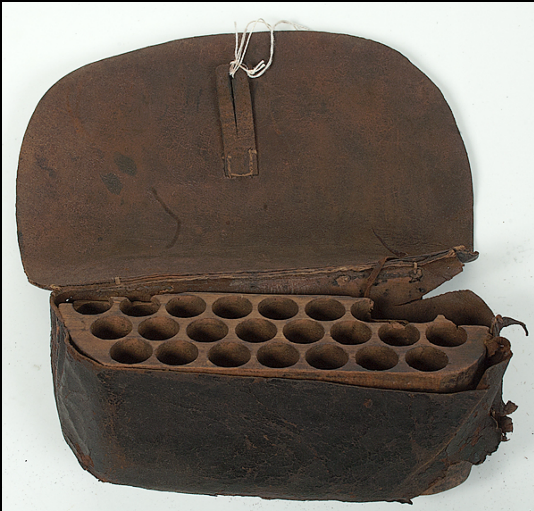
American 24 Round Cartridge Pouch 18th Century (Private Collection)