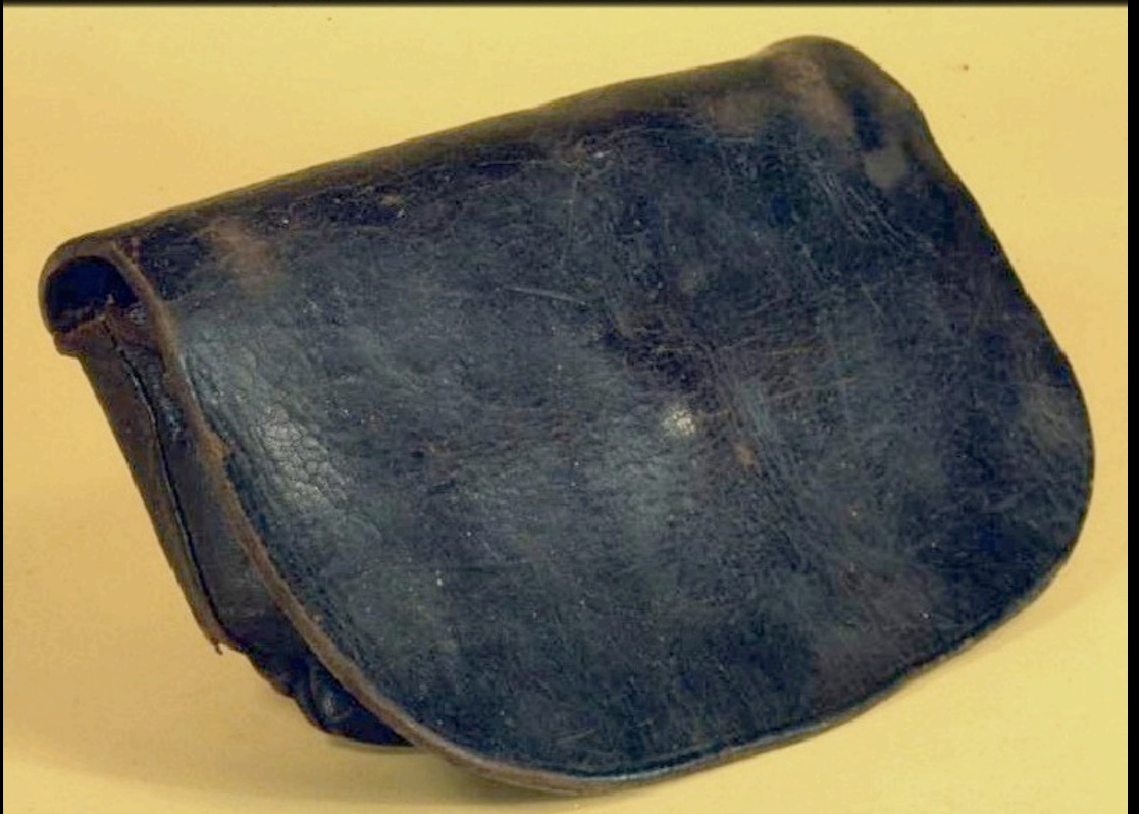
American Cartridge Pouch c. 1770s (Private Collection)