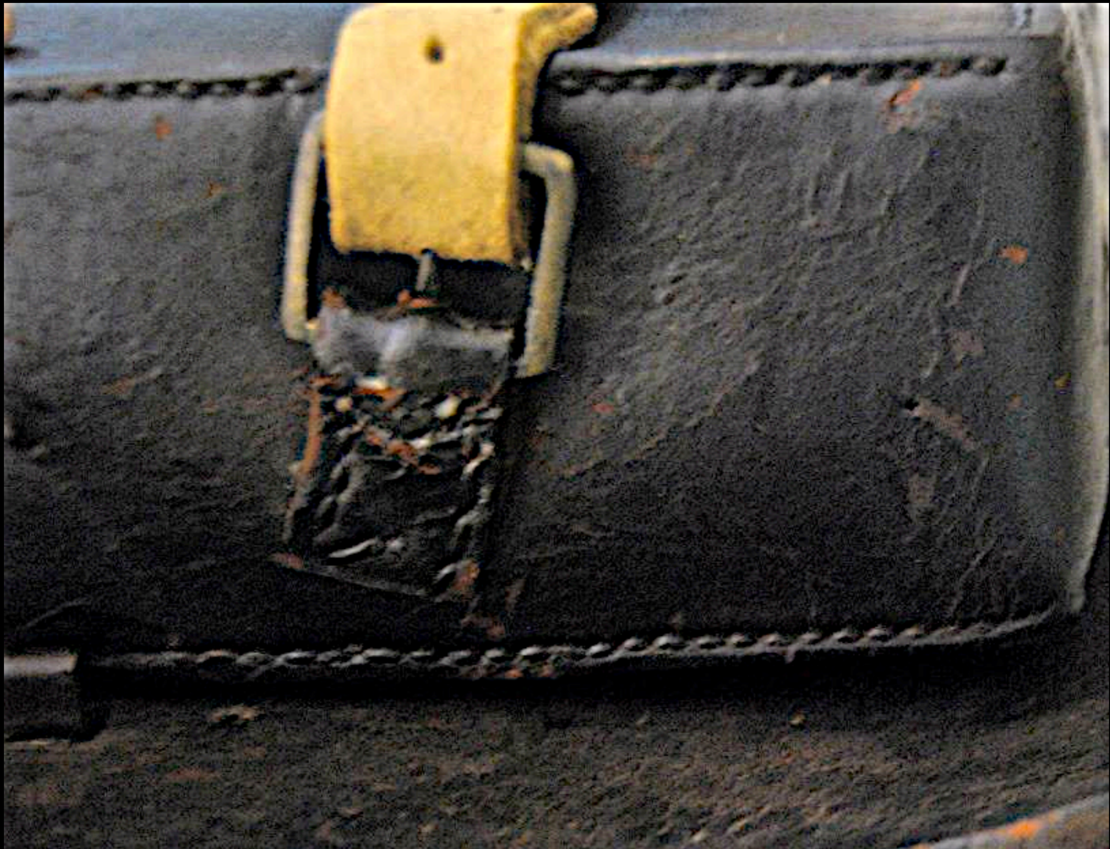
American Cartridge Pouch