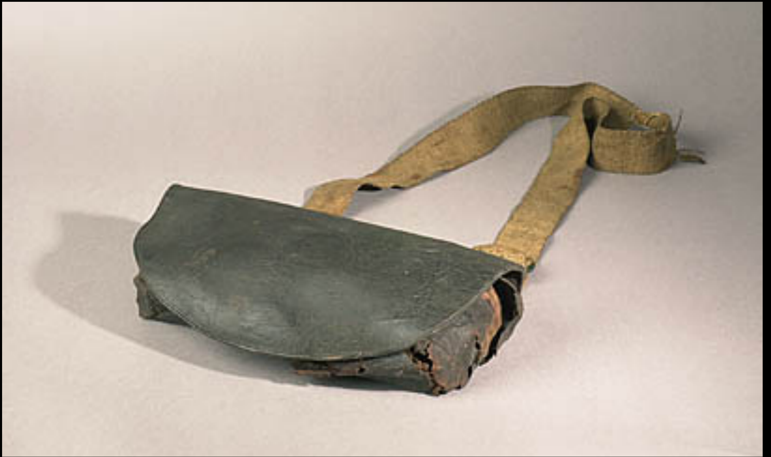
American Cartridge Pouch c. 1775 - 1780 (Valley Forge National Historic Park)