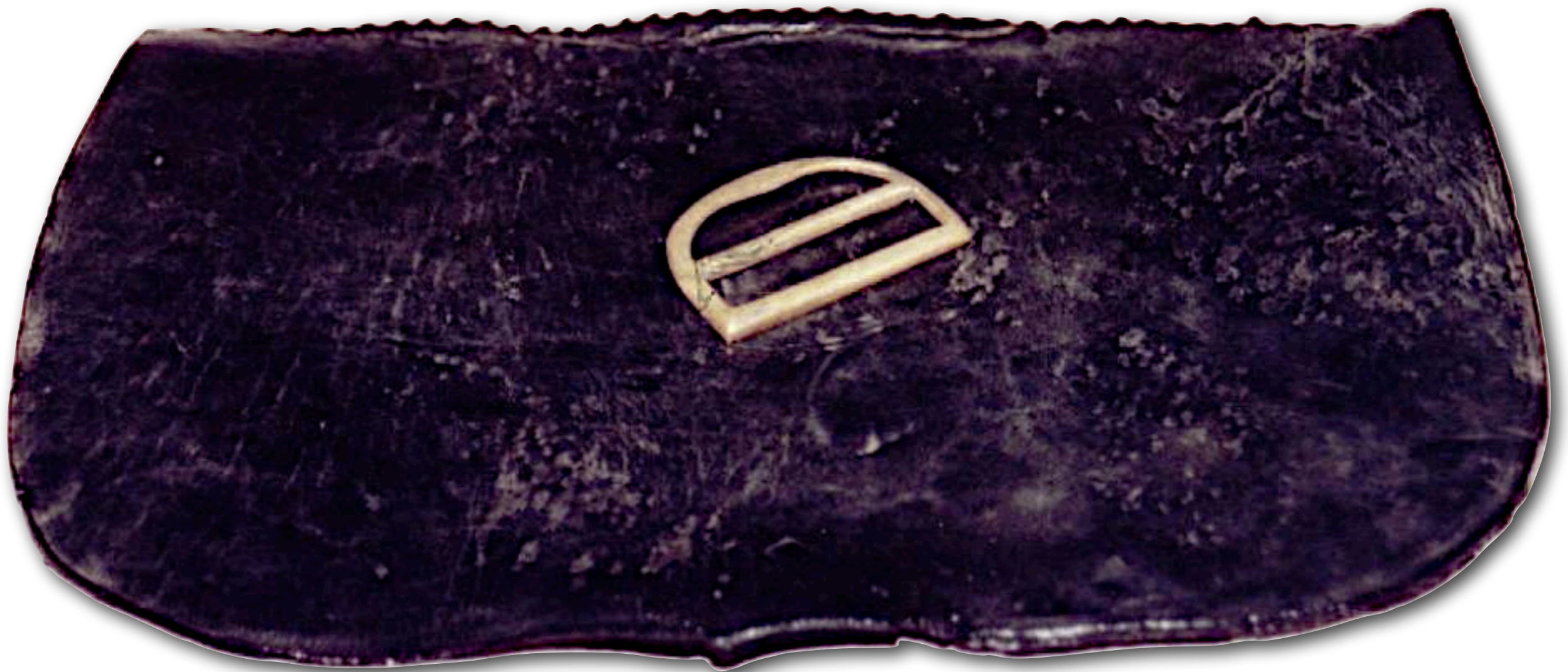
American 19 Round Cartridge Pouch Remnants. Flap Initialed "GMB" Found in Valcour Bay, Lake Champlain c. 1776 (Lake Champlain Maritime Museum - Photos Courtesy Edwin R. Scollon)