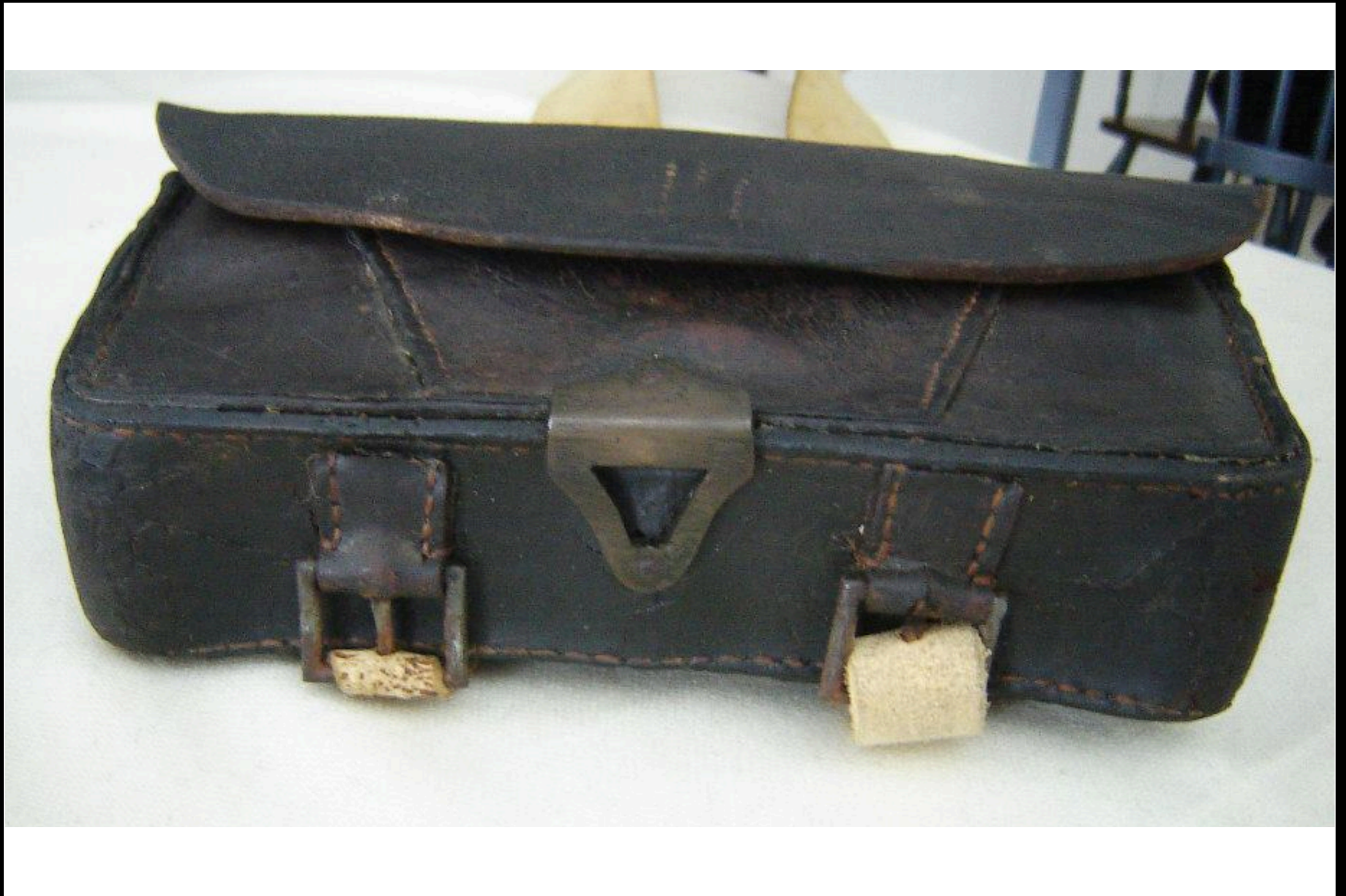
American 18 Round Modified British Light Infantry - Sergeants Pouch with Tin Tray