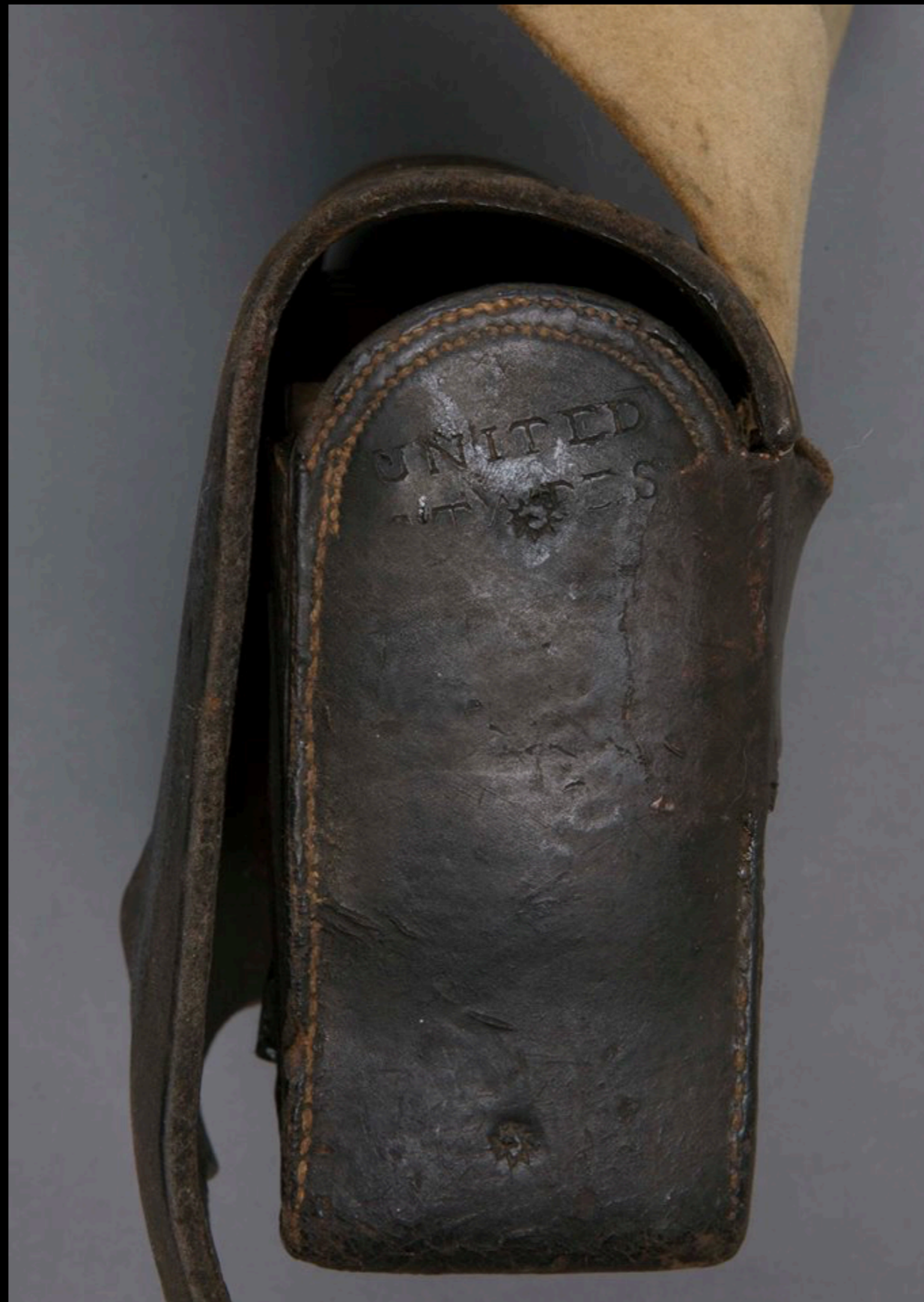
American New Invented Cartridge Pouch Stamped "UNITED STATES" and "W. HAWES" (Inspector at Springfield Arsenal) with "British System" Closure