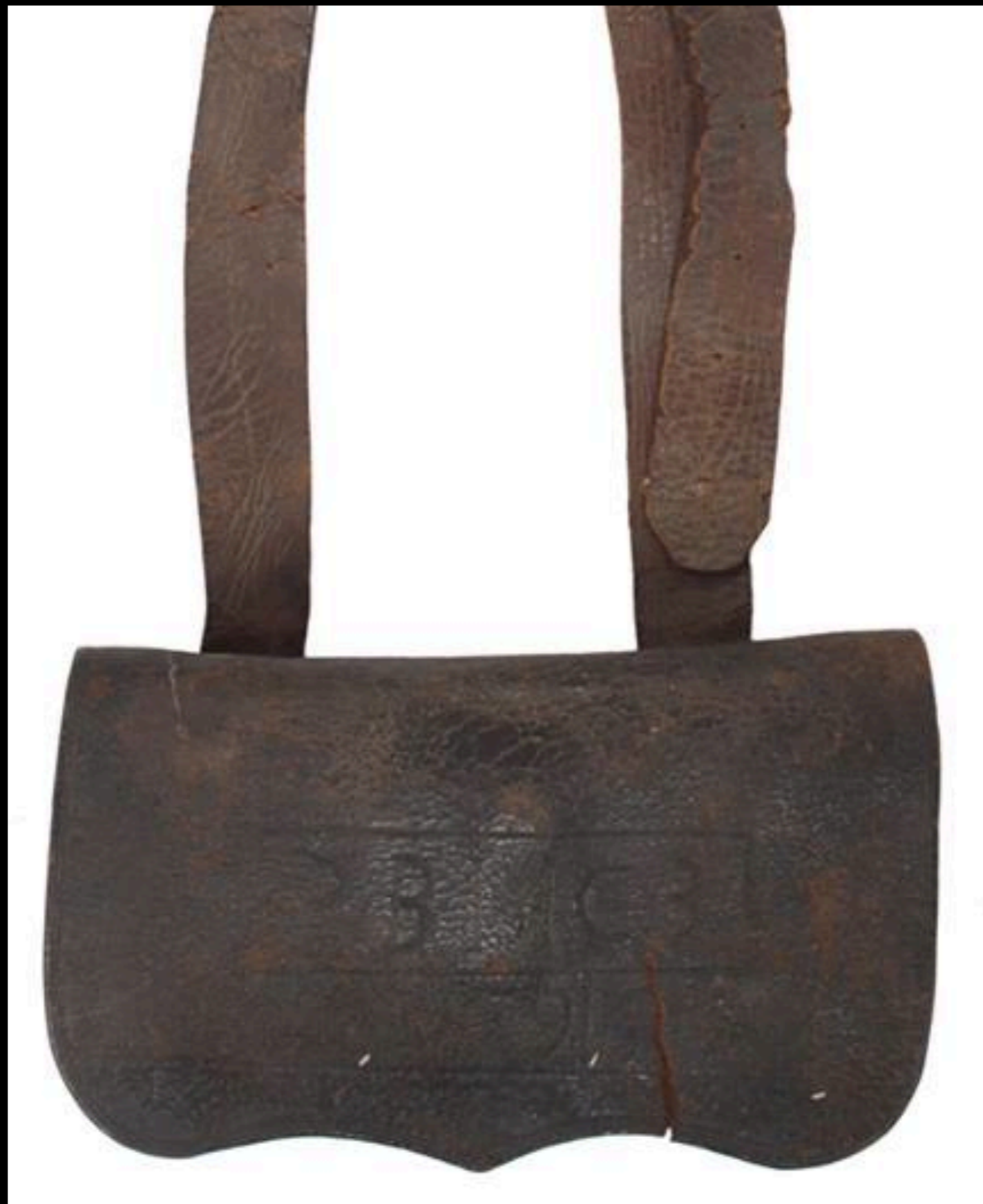
American Cartridge Pouch Dated 1779 (Don Troiani)