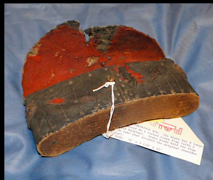
American 8 Round Tarred Linen Cartridge Box (Formerly George Neuman Collection)