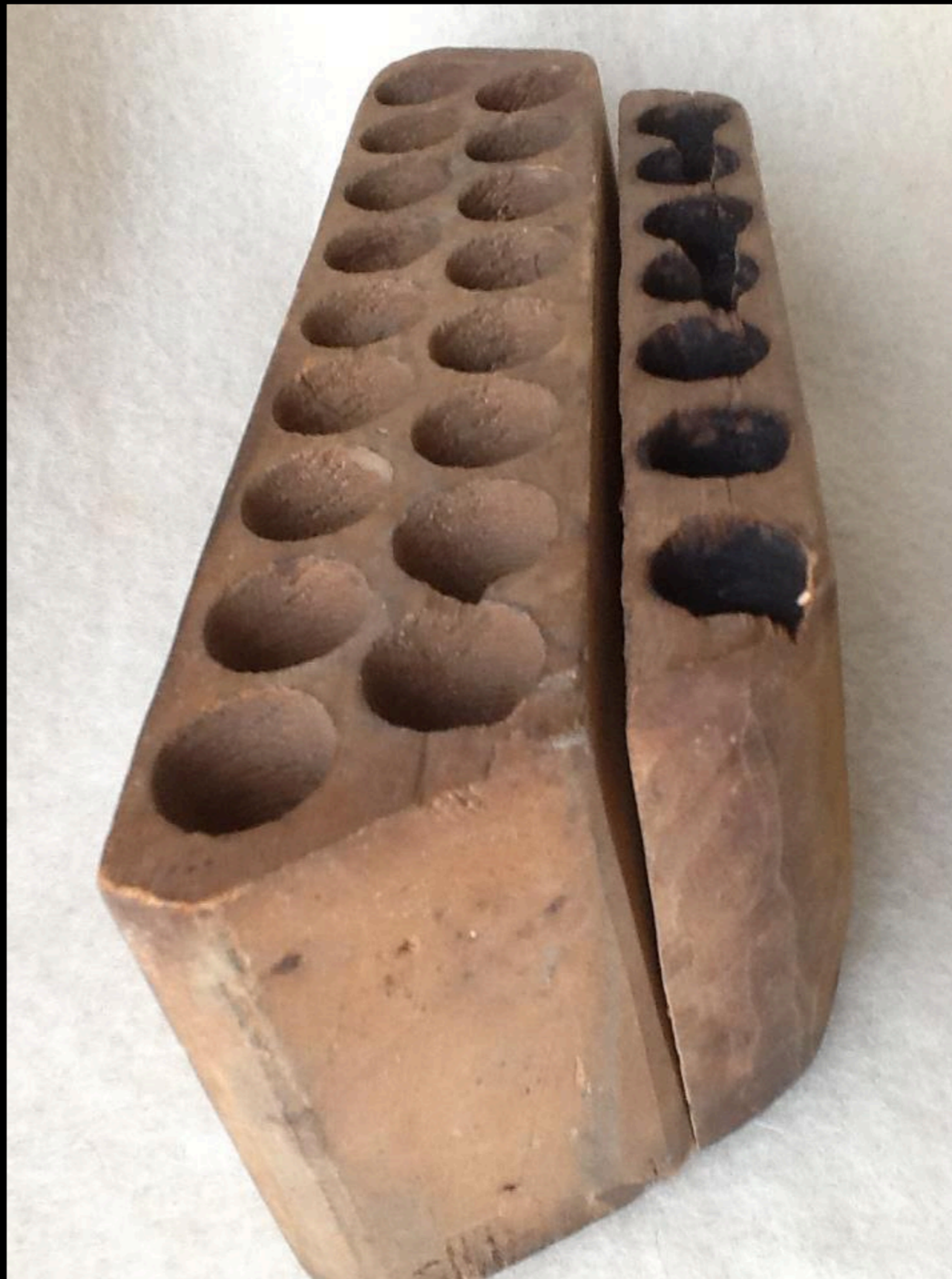
American 17 Round Cartridge Pouch with 7 Round Block Addition 18th Century (Private Collection)