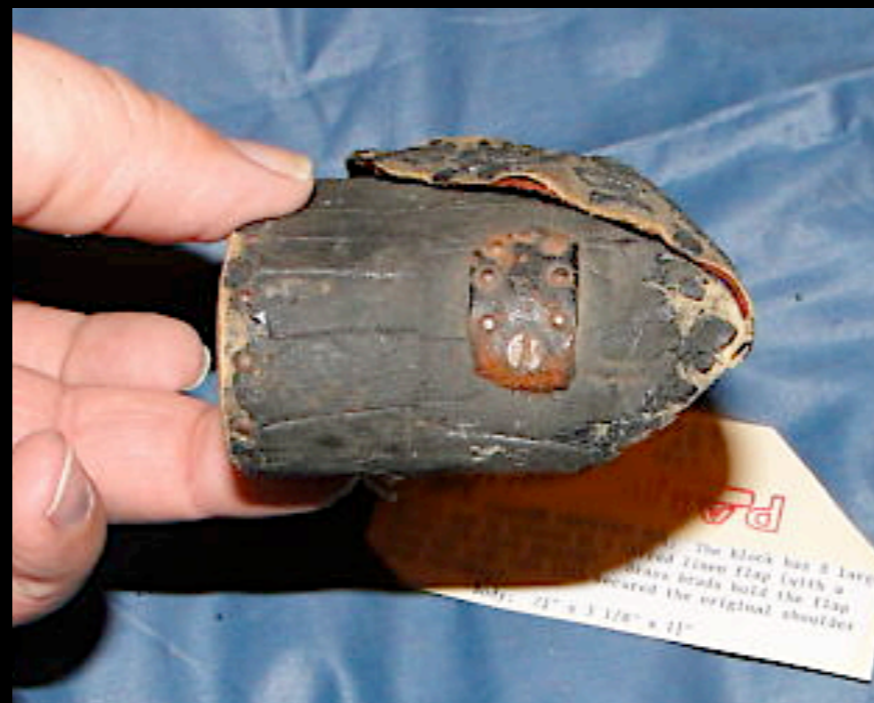
American 8 Round Tarred Linen Cartridge Box (Formerly George Neuman Collection)