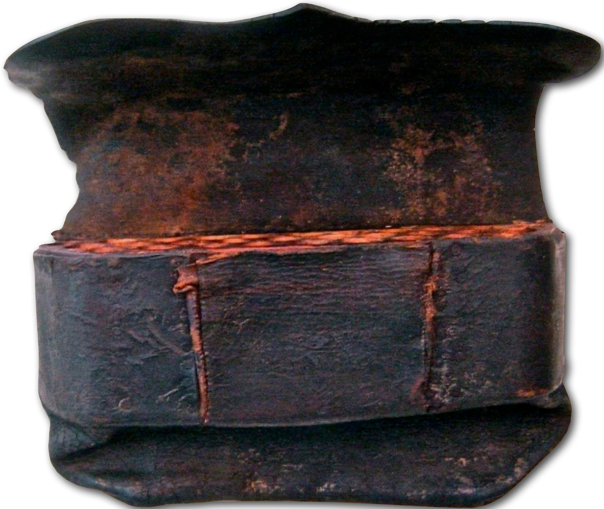
American 30 Round Cartridge Pouch 18th Century

(Colonel Craig J. Nannos Collection - Photograph Courtesy Andrew Watson Kirk)