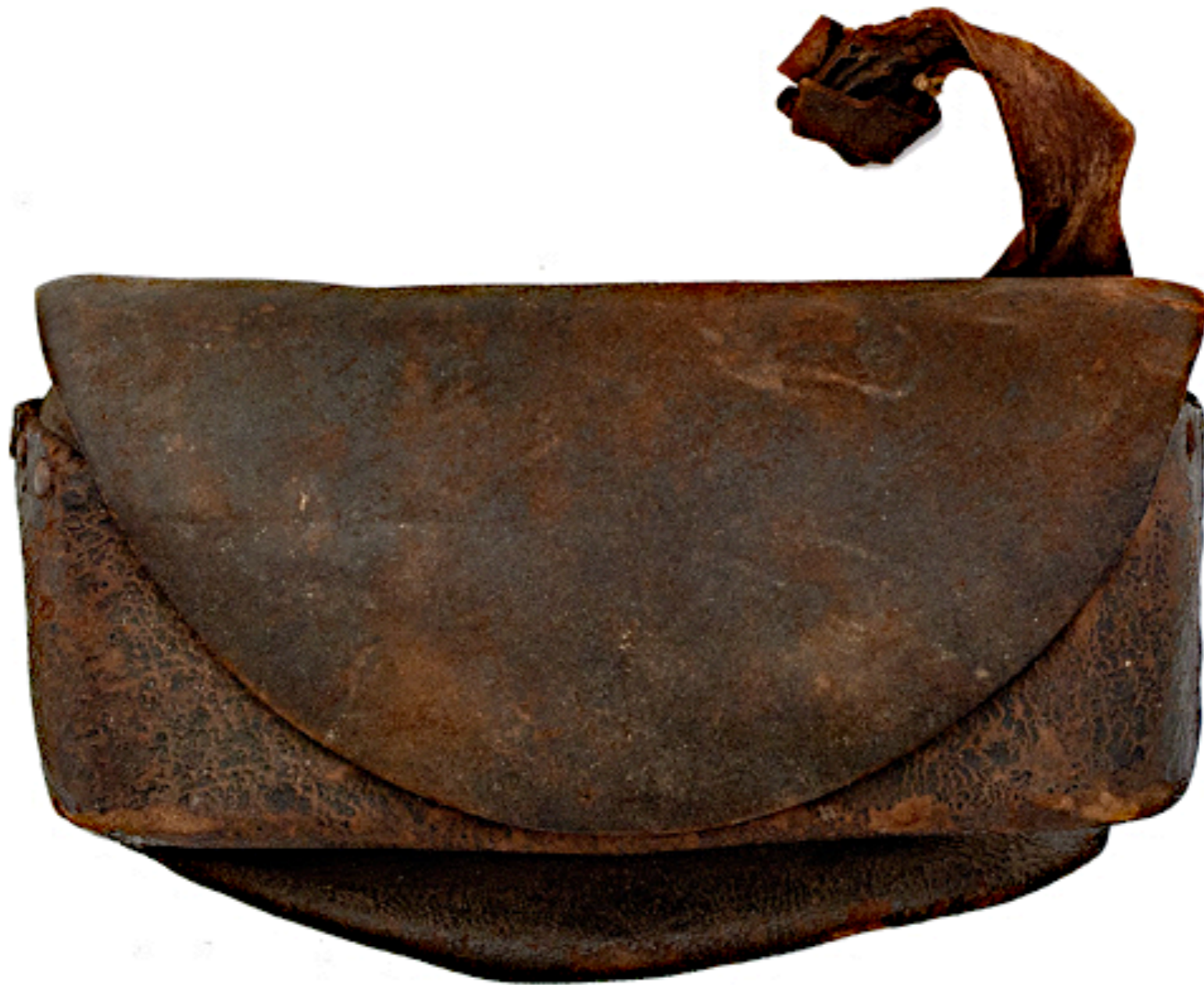
American 24 Round Cartridge Pouch Converted to a Cartridge Box