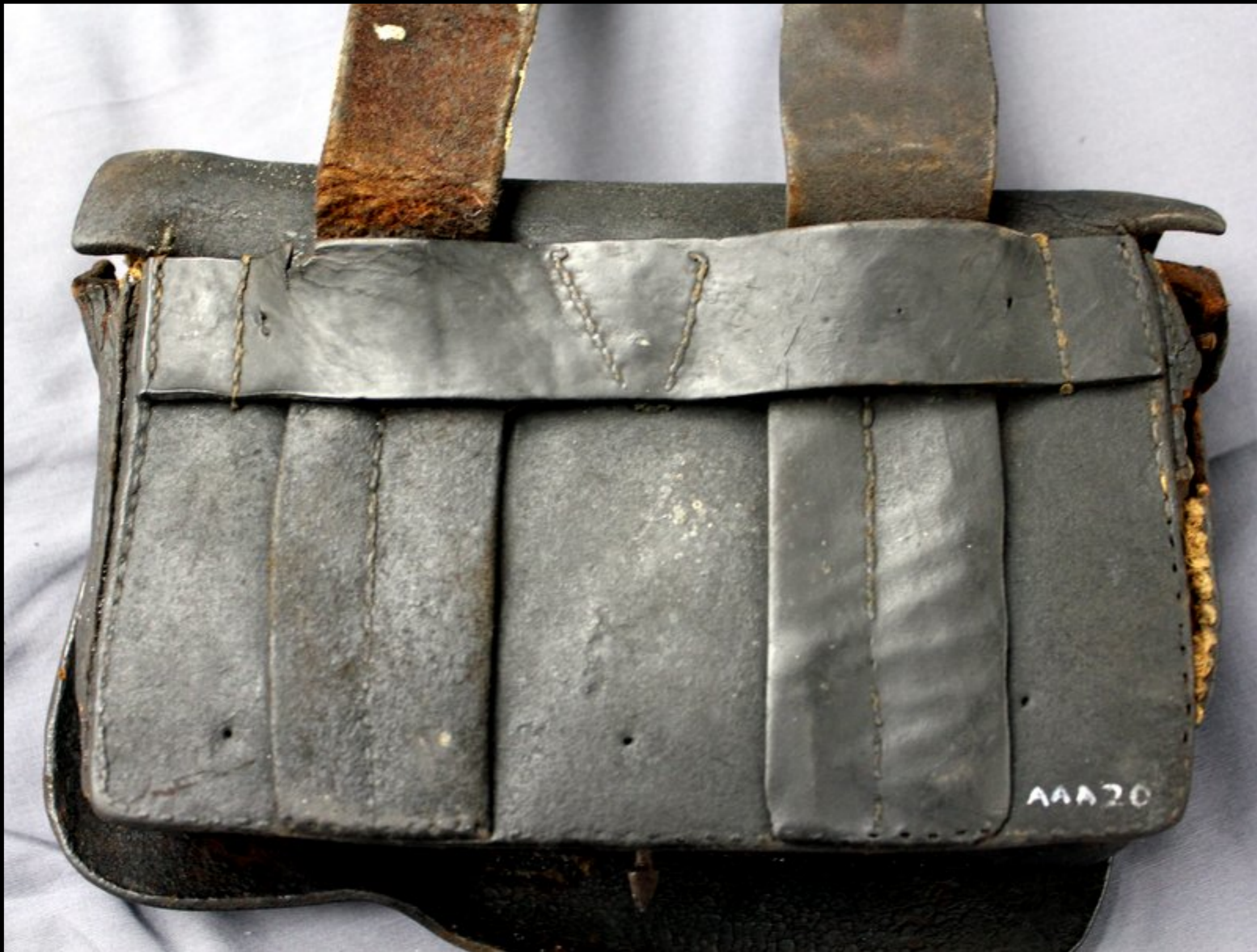
American New Invented Cartridge Pouch Stamped "U. STATES" with "American System" Closure (Don Troiani)