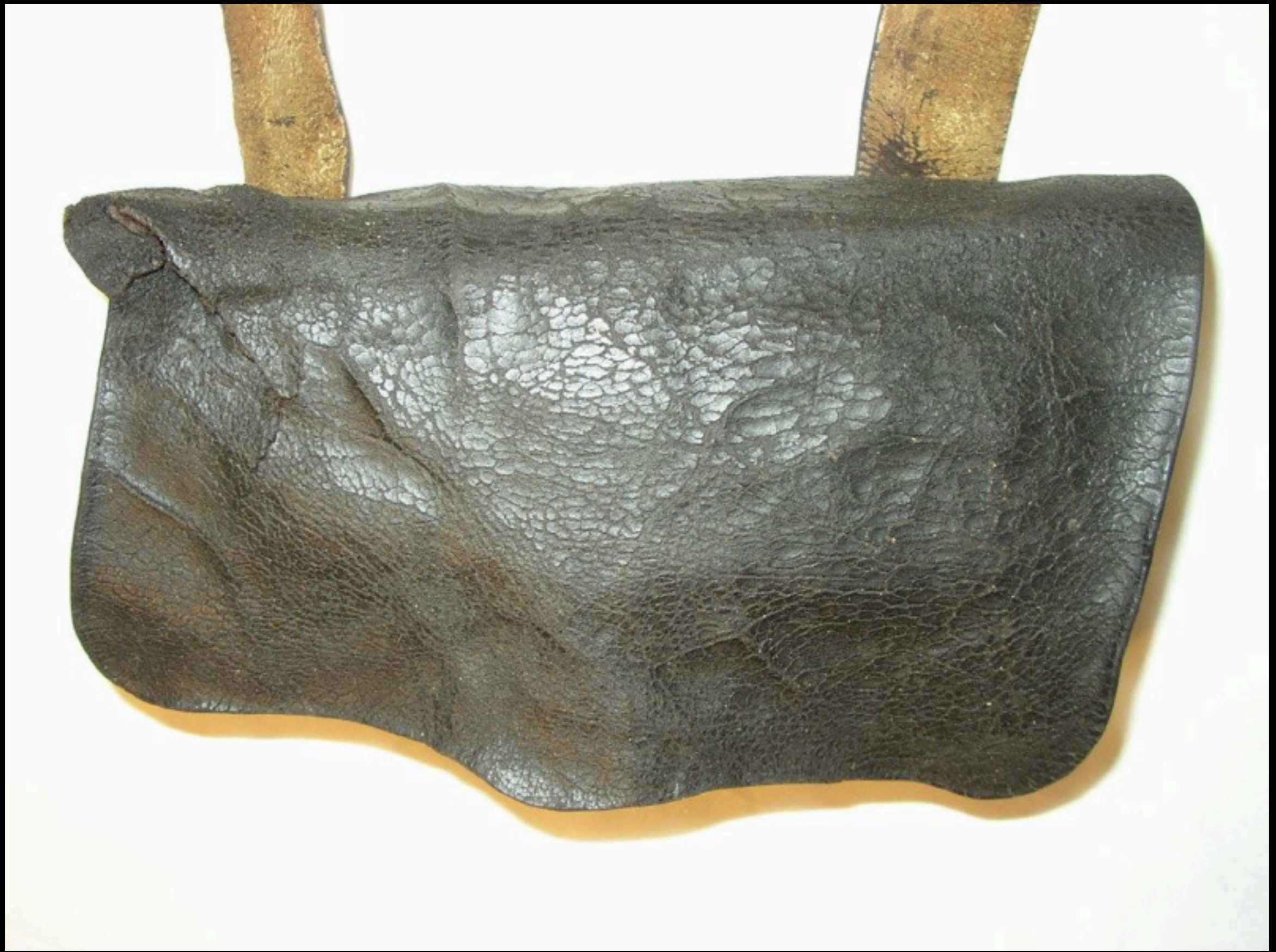
American 24 Round Cartridge Pouch 18th Century (Private Collection)