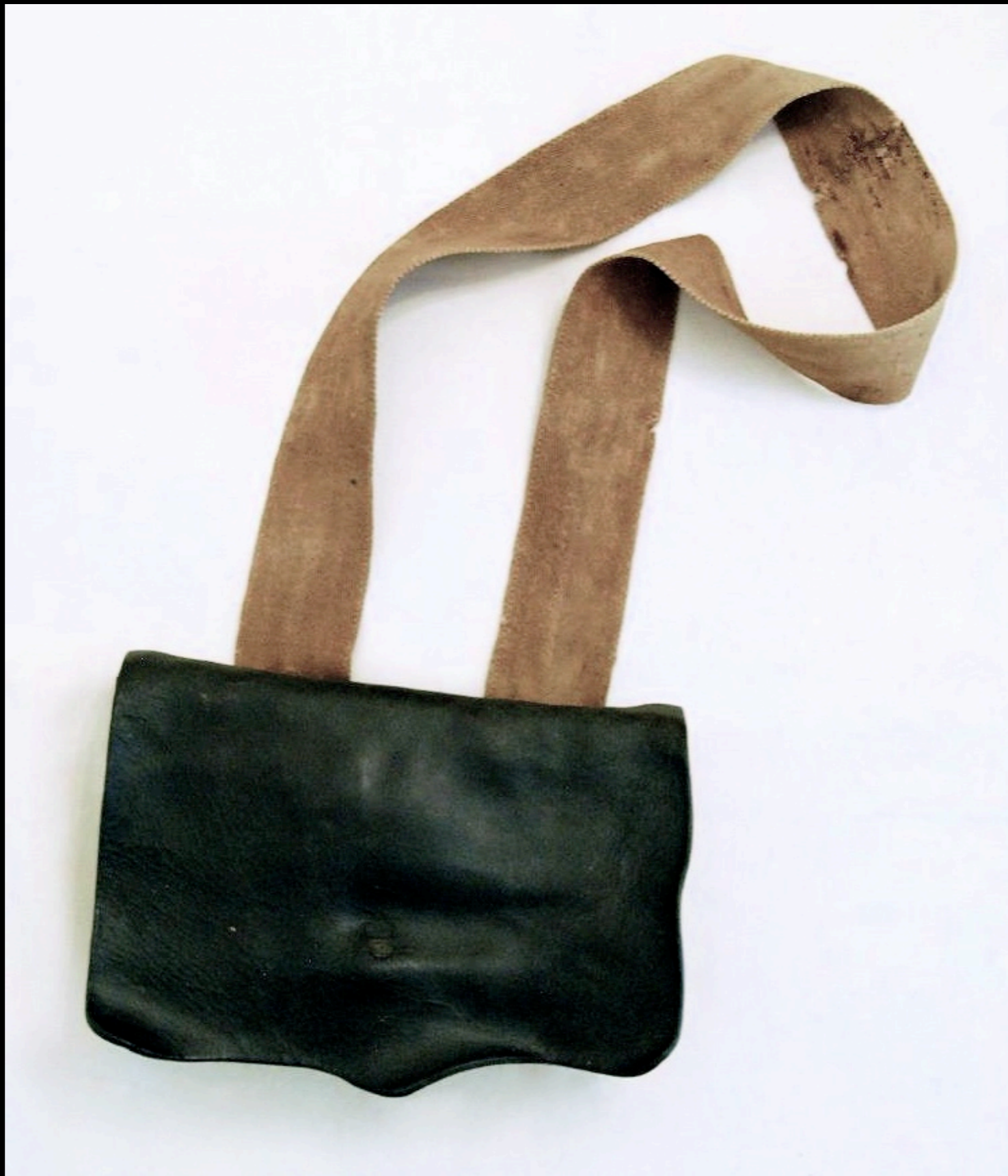
American 20 Round Cartridge Pouch