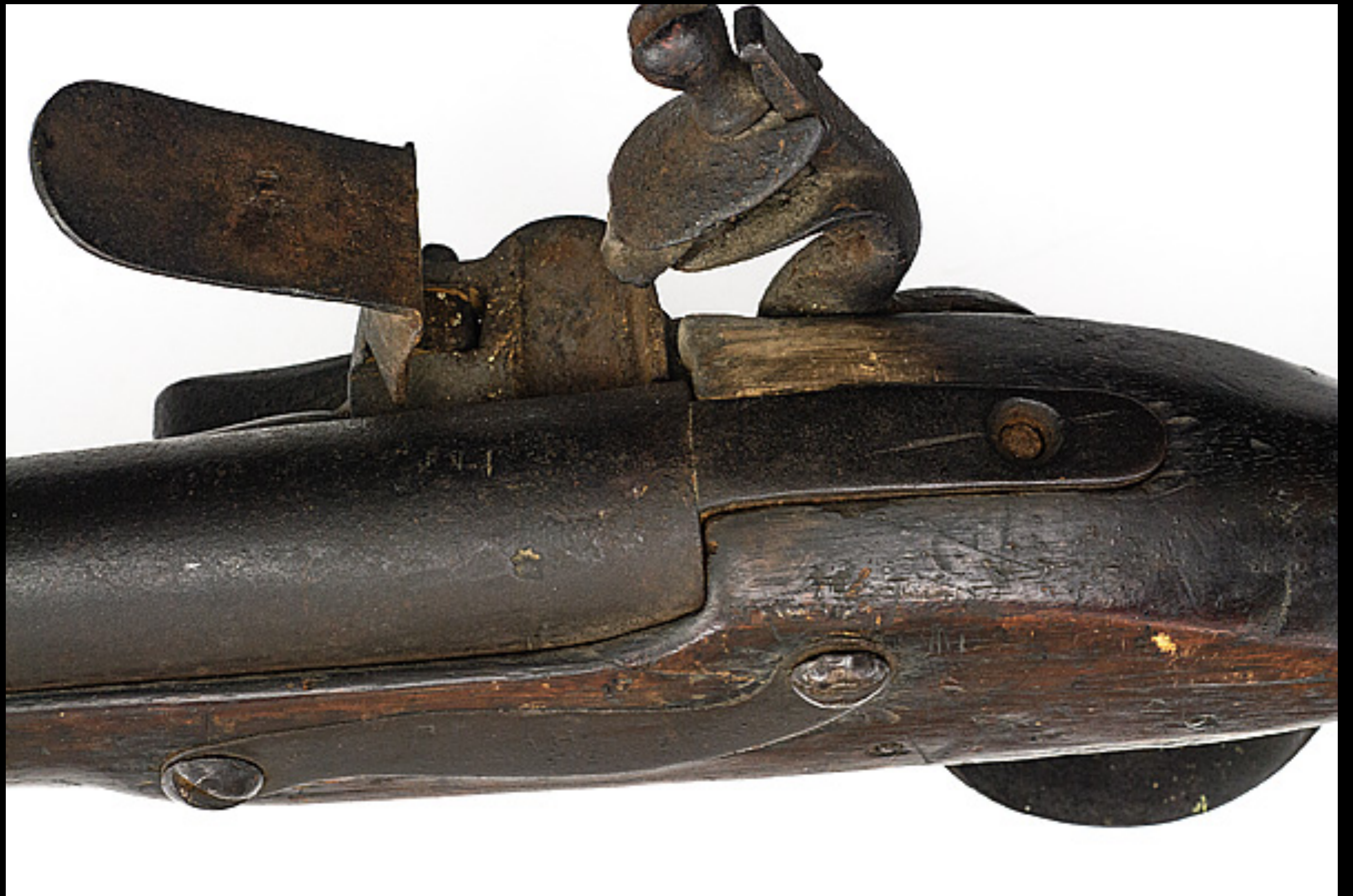
French "Model 1774" Firelock Marked "U. STATES" (Cowan's Auctions)