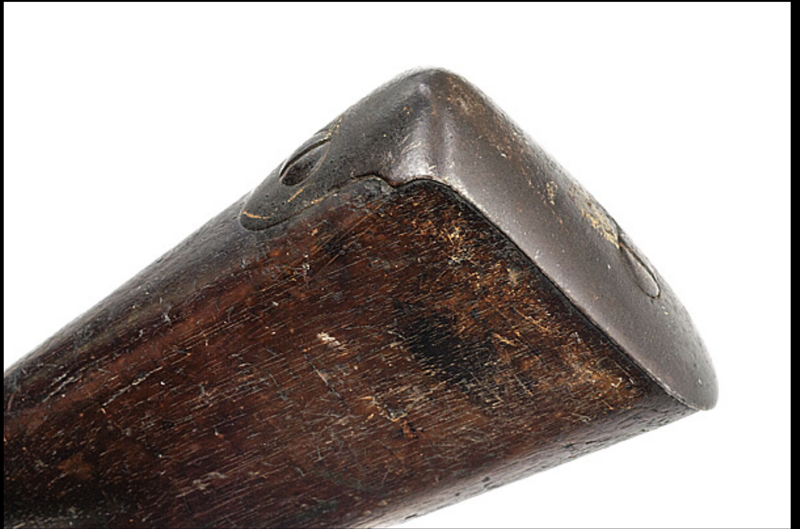
French "Model 1774" Firelock Marked "U. STATES" (Cowan's Auctions)