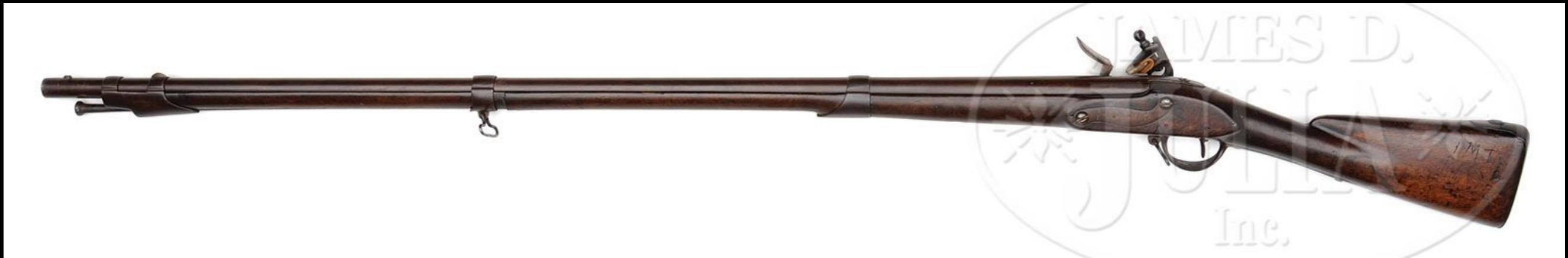
French "Model 1774" Firelock Marked "UNITED STATES" Charleville Armory