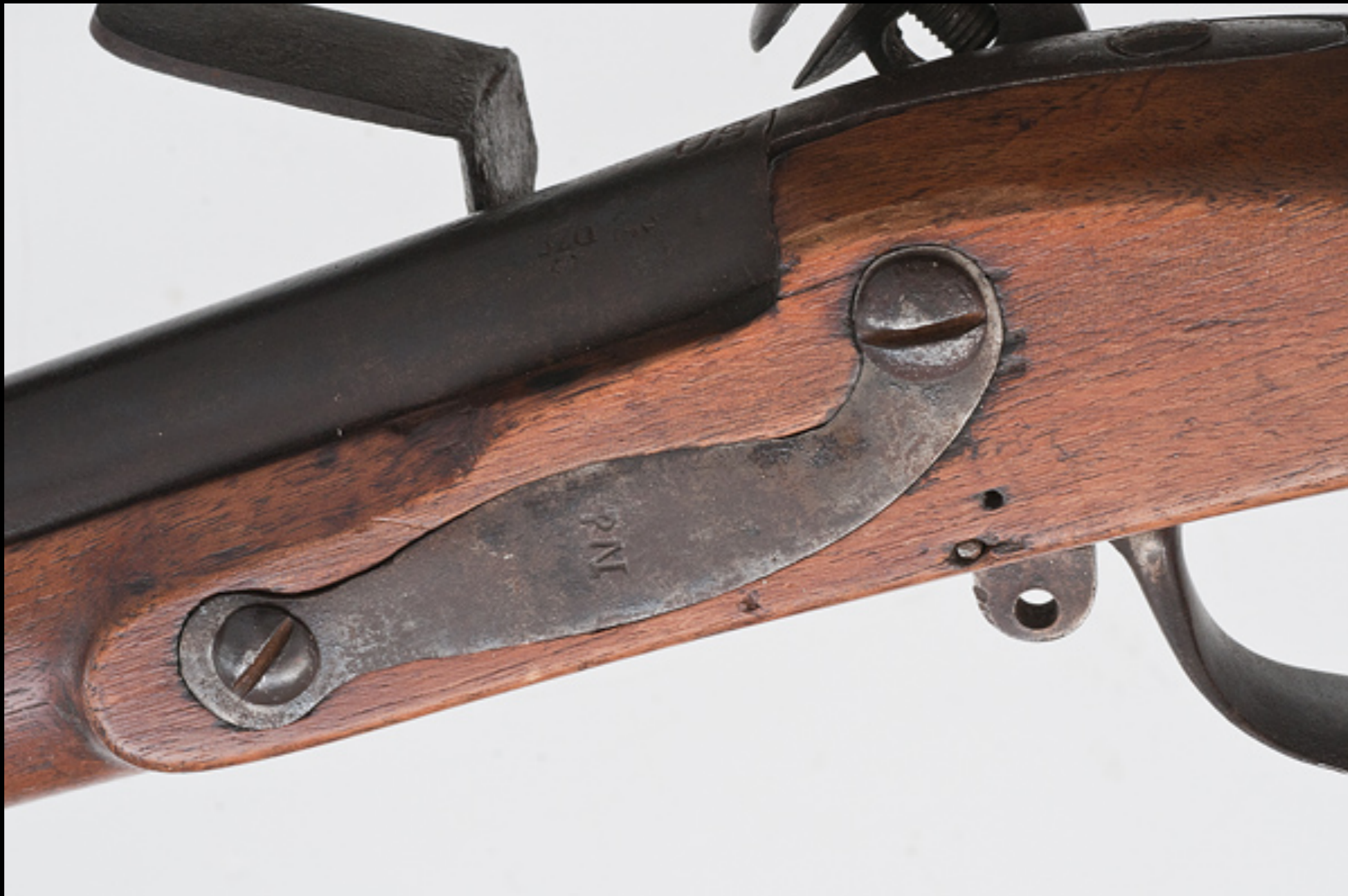
French "Model 1754" Firelock with "U.S." Surcharge New Lock, Trigger, and Barrel of the 1774 Pattern