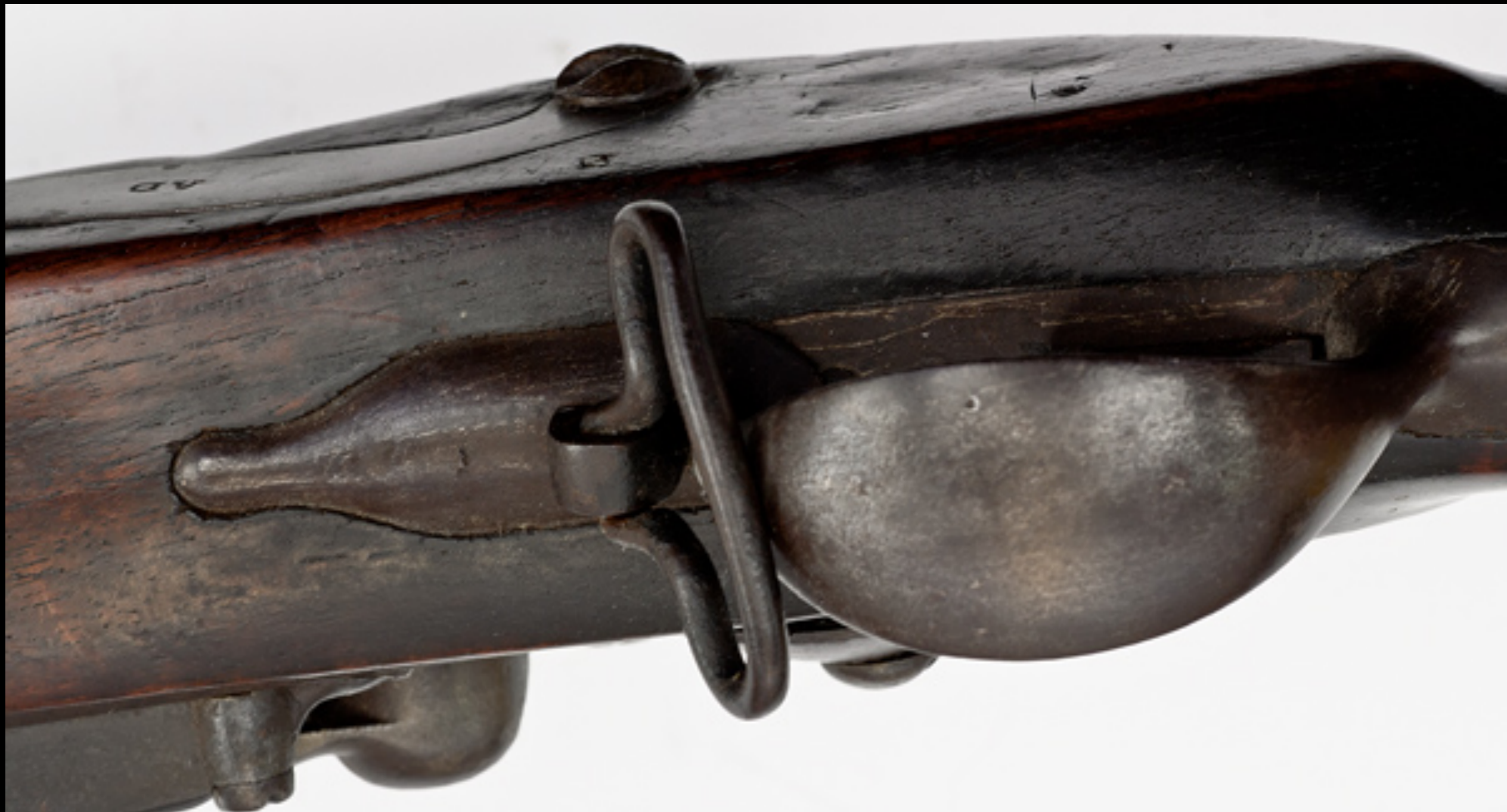
French "Model 1771" Firelock with 1774 Modifications Marked "UNITED STATES"