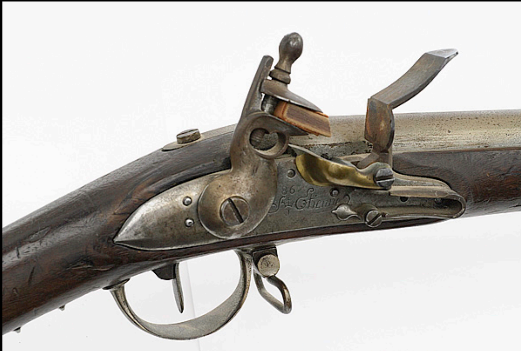
French "Model 1777" Firelock Replaced Ramrod