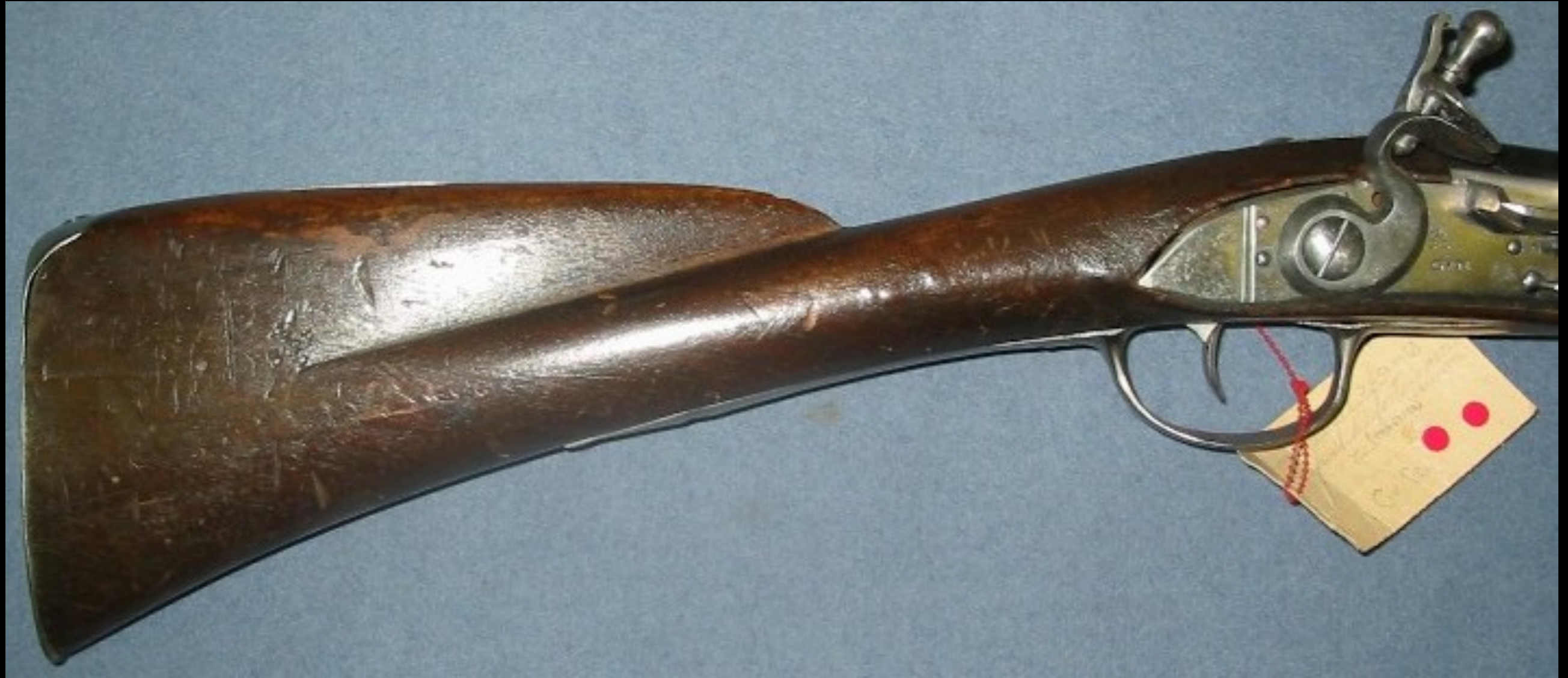
French "Model 1728" Firelock c. 1728 (Private Collection)