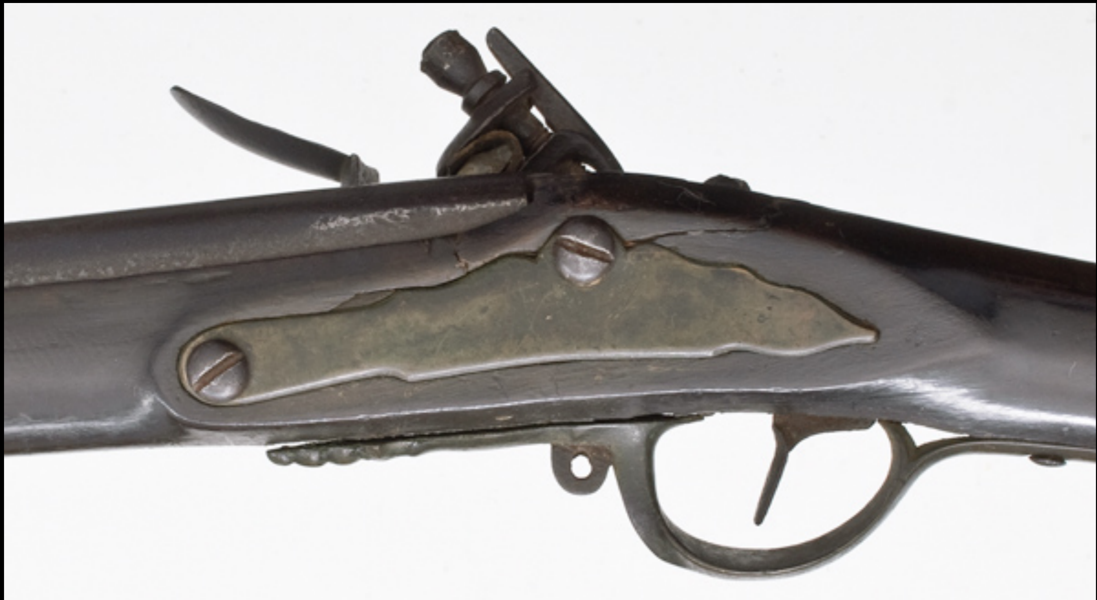
French "Model 1772" Marine Firelock Brass Furniture & Blackened Lock (Cowan's Auctions)