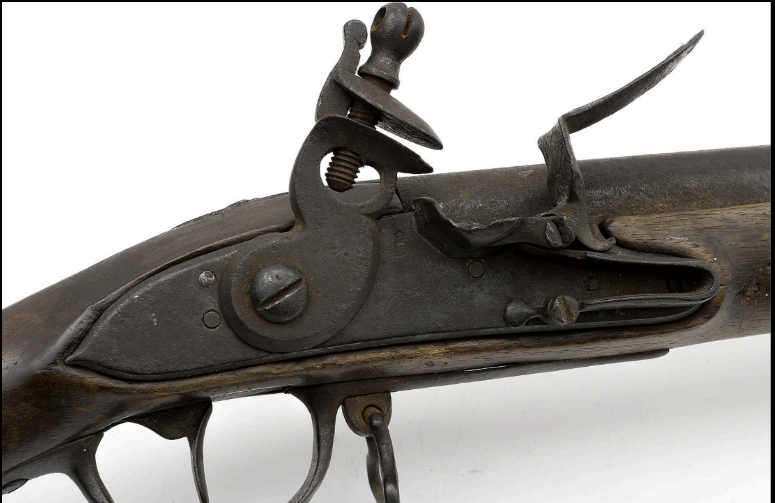
French "Model 1763" Firelock Charleville Armory