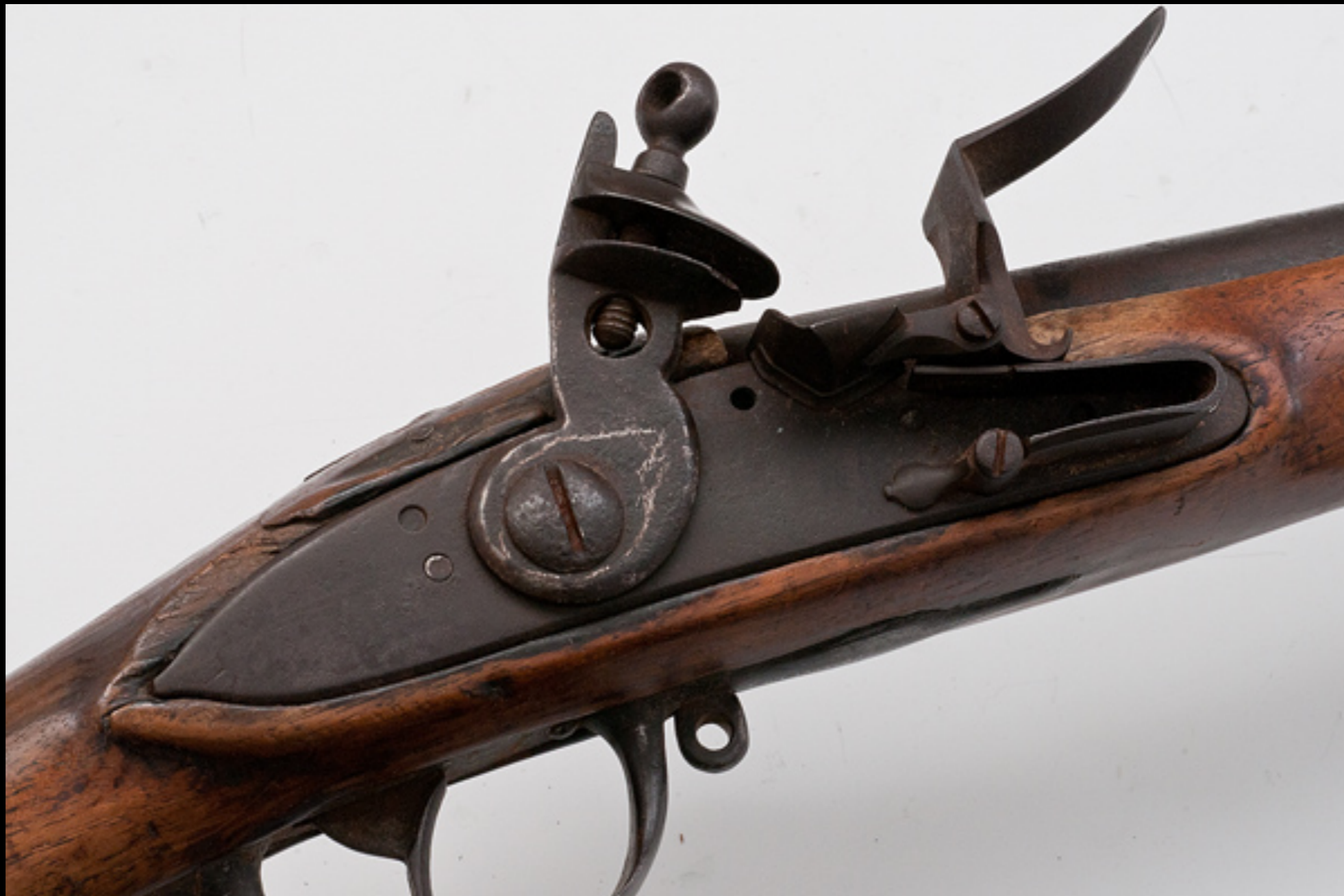
French "Model 1754" Firelock with American Lockplate Attributed to the Continental Gun Manufactory in Philadelphia - U.S. Surcharge on Barrel (Cowan's Auctions)