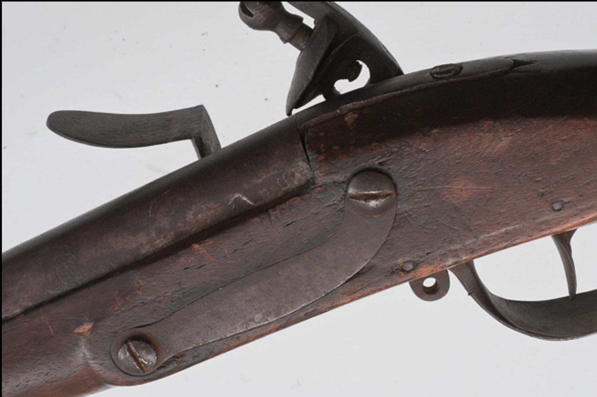
French "Model 1766" Firelock with American Lockplate c. 1766