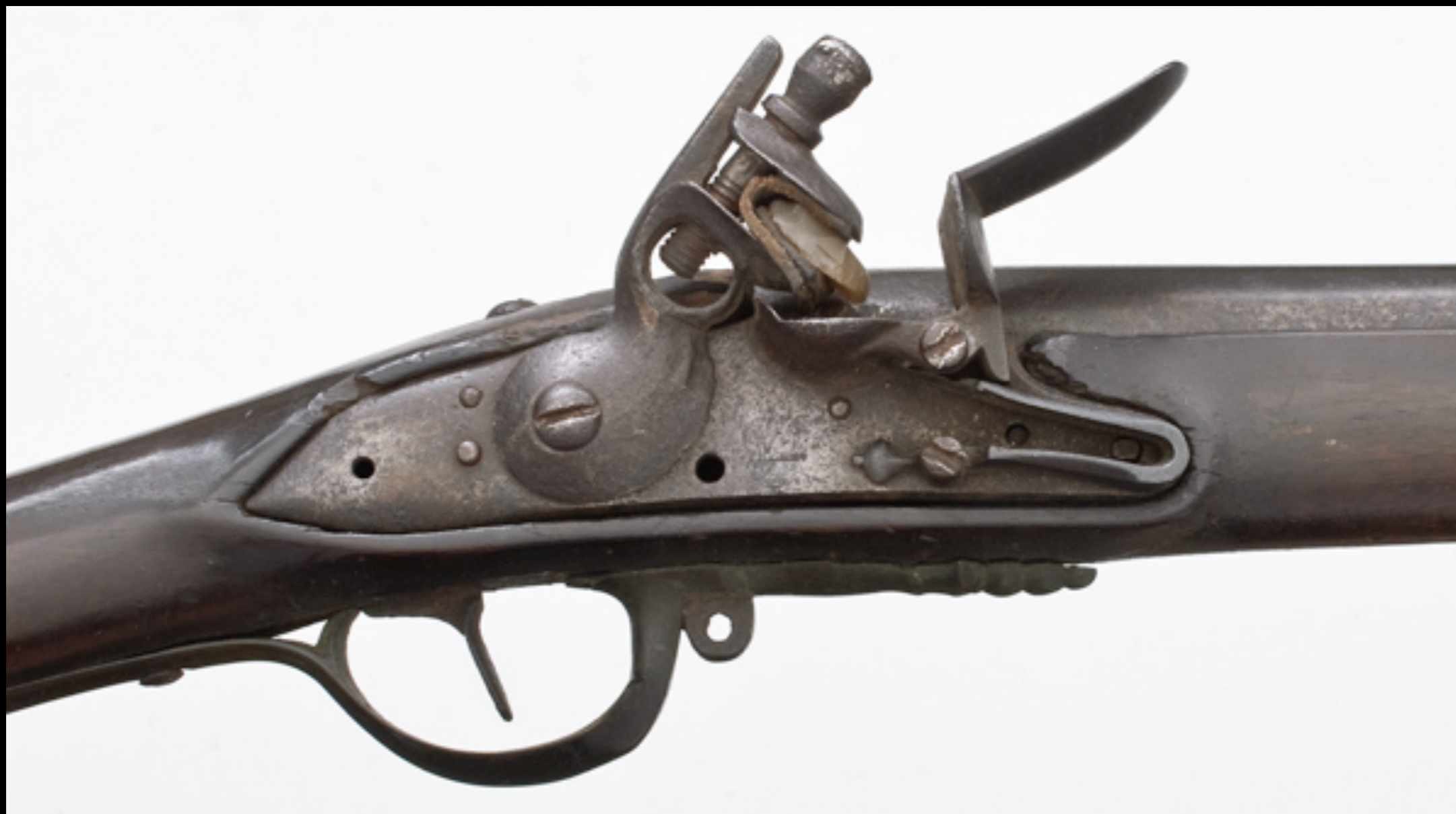
French "Model 1772" Marine Firelock Brass Furniture & Blackened Lock (Cowan's Auctions)