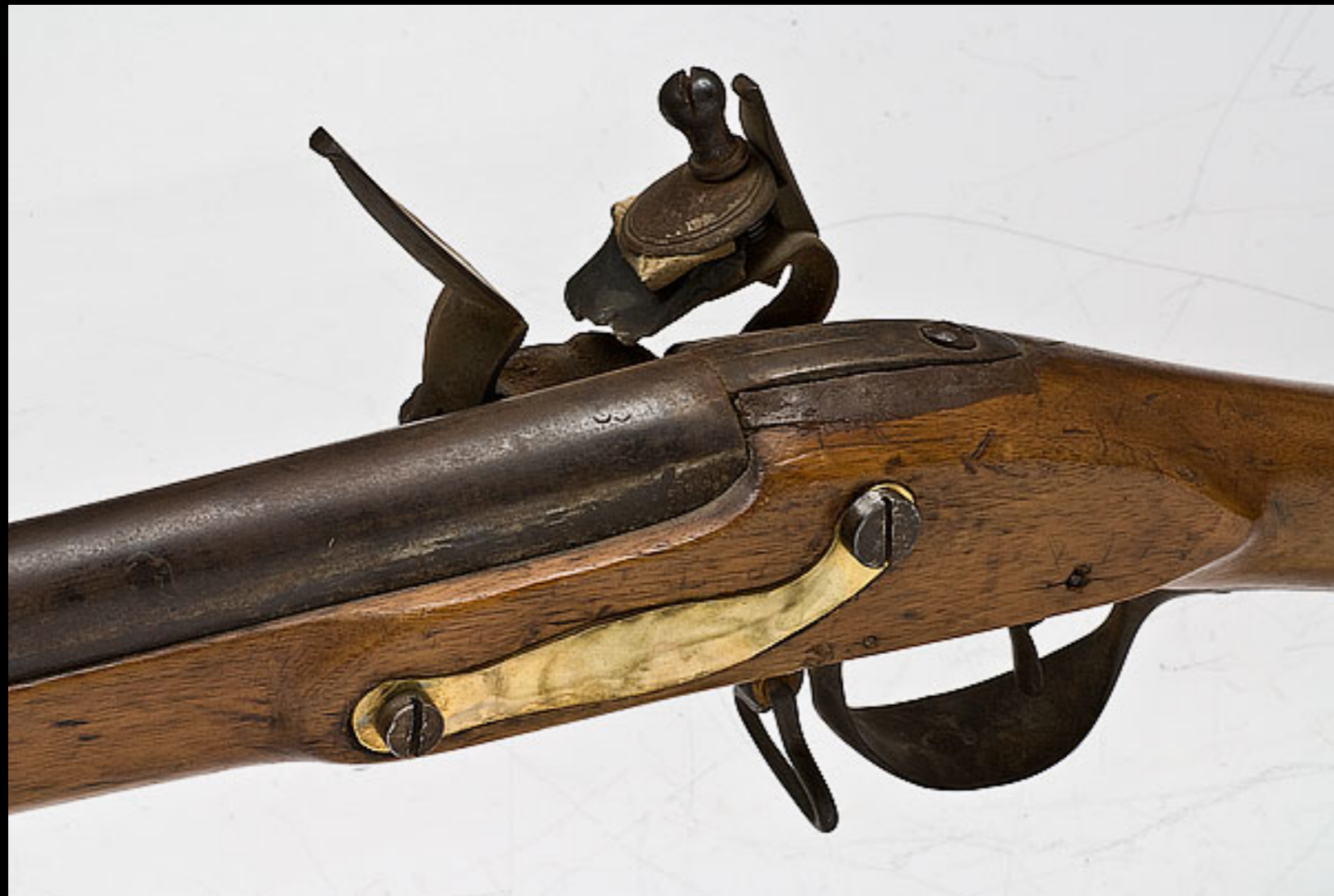
French "Model 1763" Firelock Marked by Seth Nickerson of Massachusetts