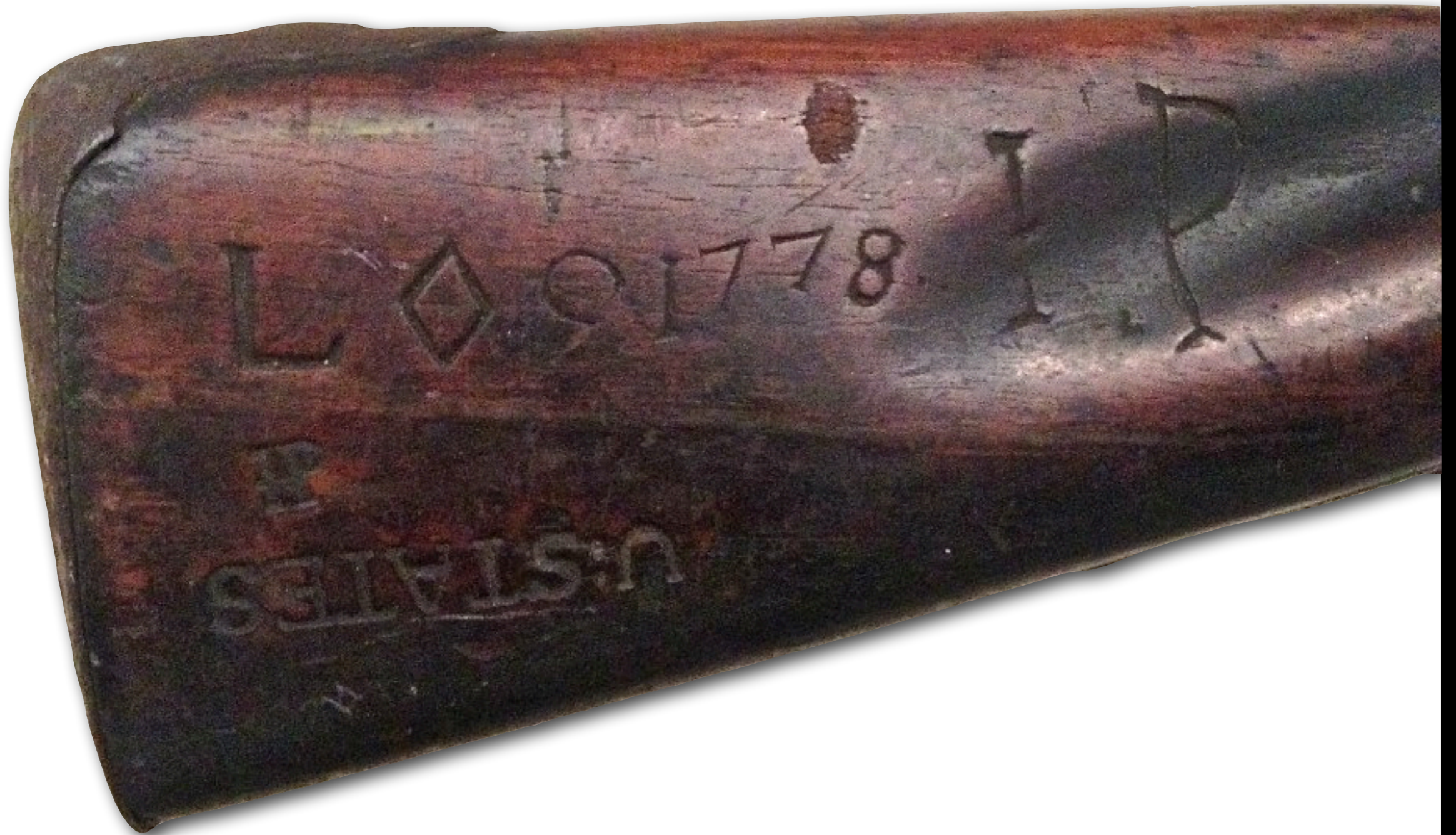
French "Model 1766" Firelock Marked "U. STATES" & "1778" (Brandywine State Park - Photo Courtesy Andrew Watson Kirk)