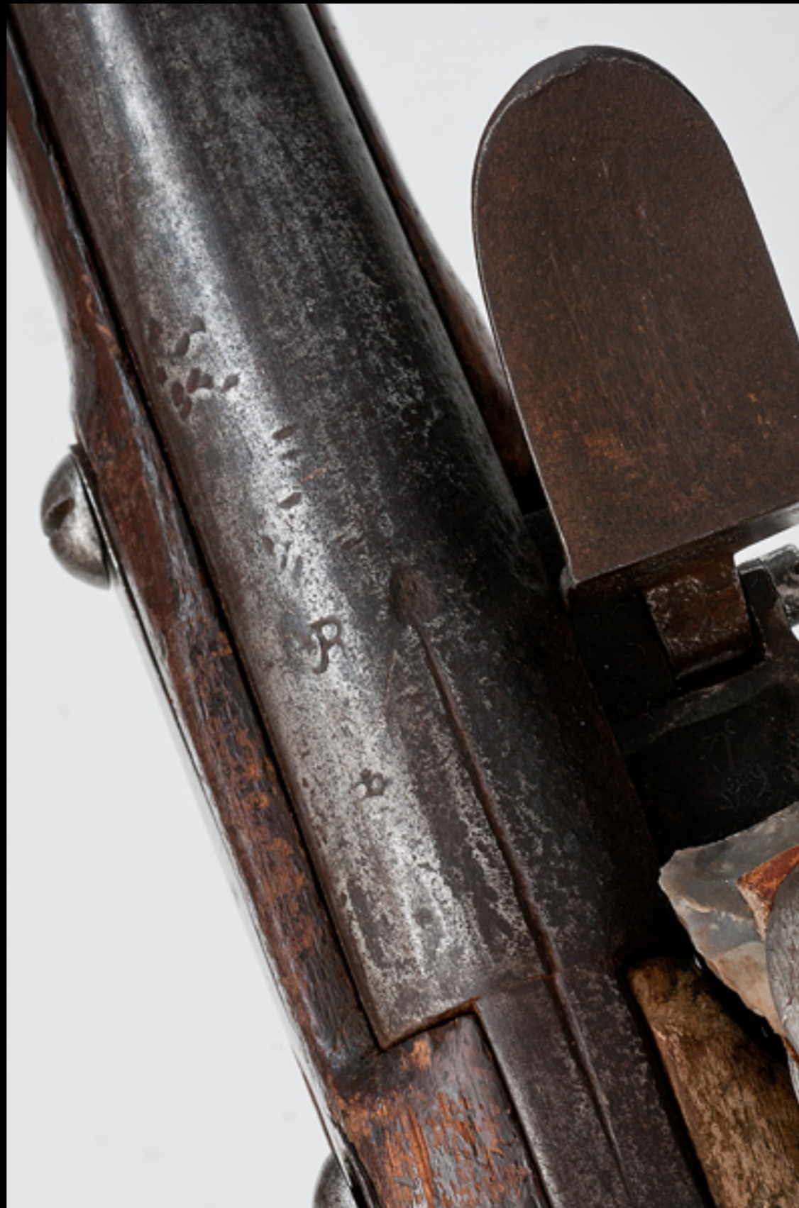
French "Model 1763" Firelock Royal Maulbeuge Armory