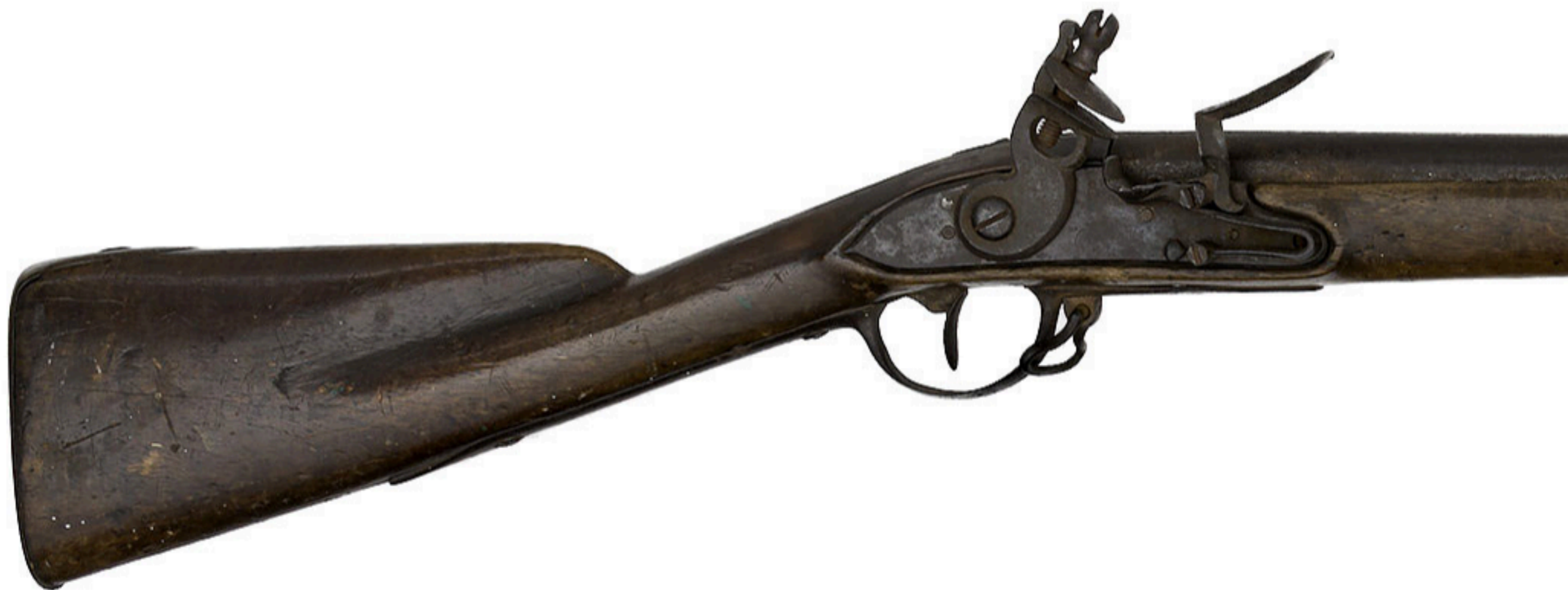
French "Model 1763" Firelock Charleville Armory (Cowan's Auctions)