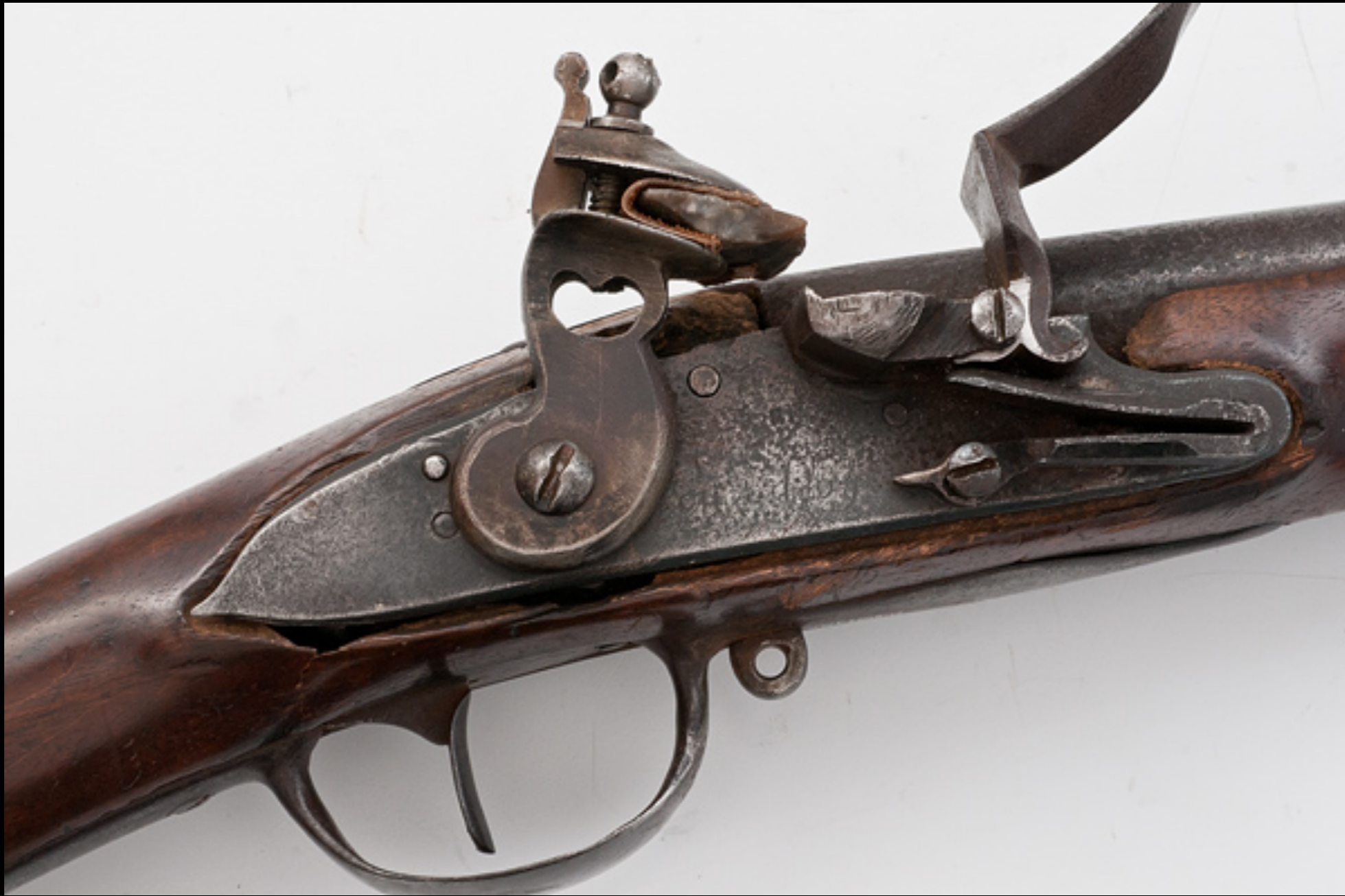
French "Model 1763" Firelock Royal Maulbeuge Armory