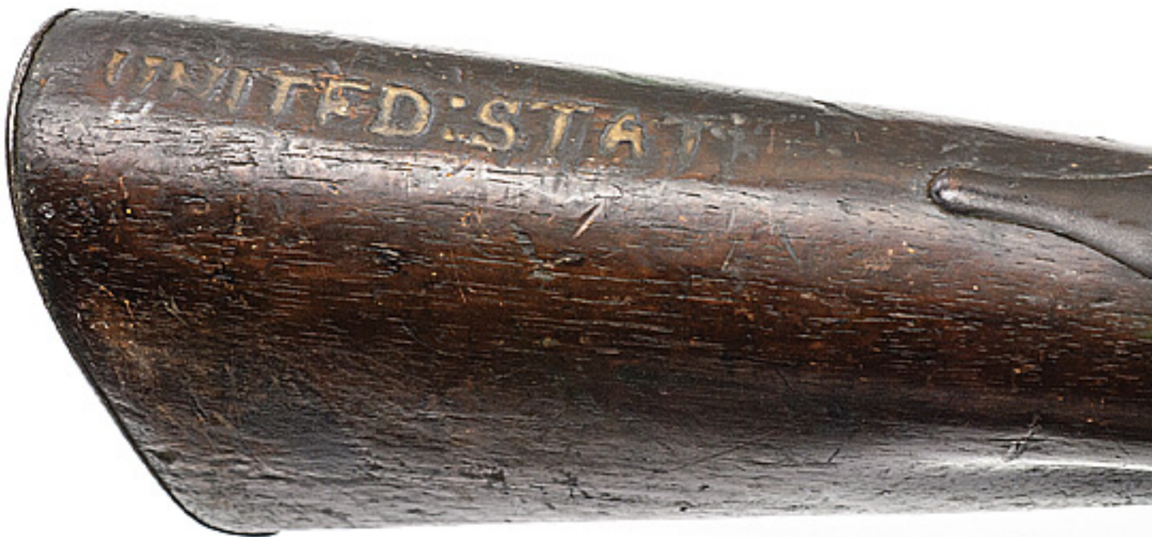
French "Model 1774" Firelock Marked "U. STATES"