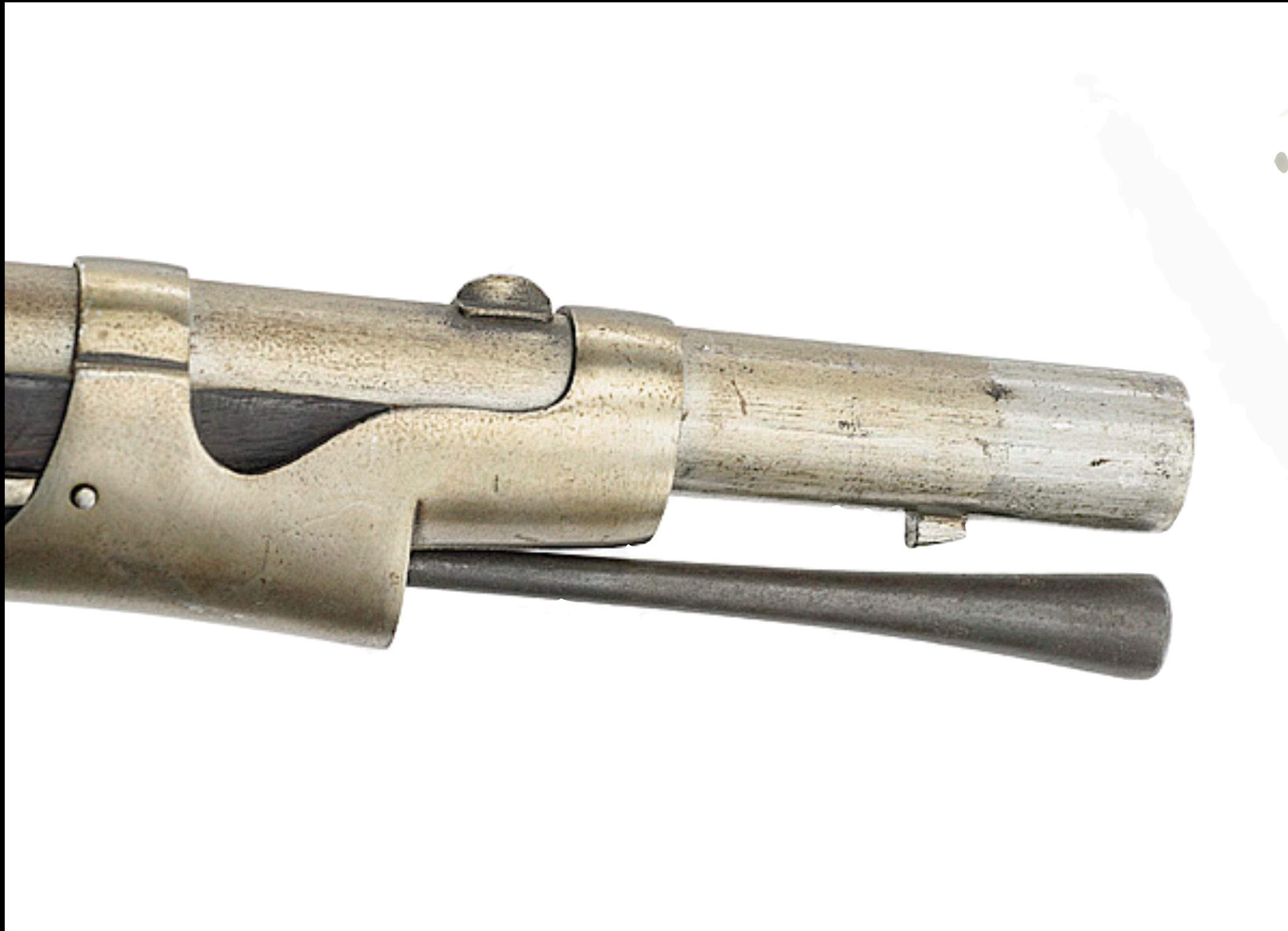
French "Model 1777" Firelock Replaced Ramrod