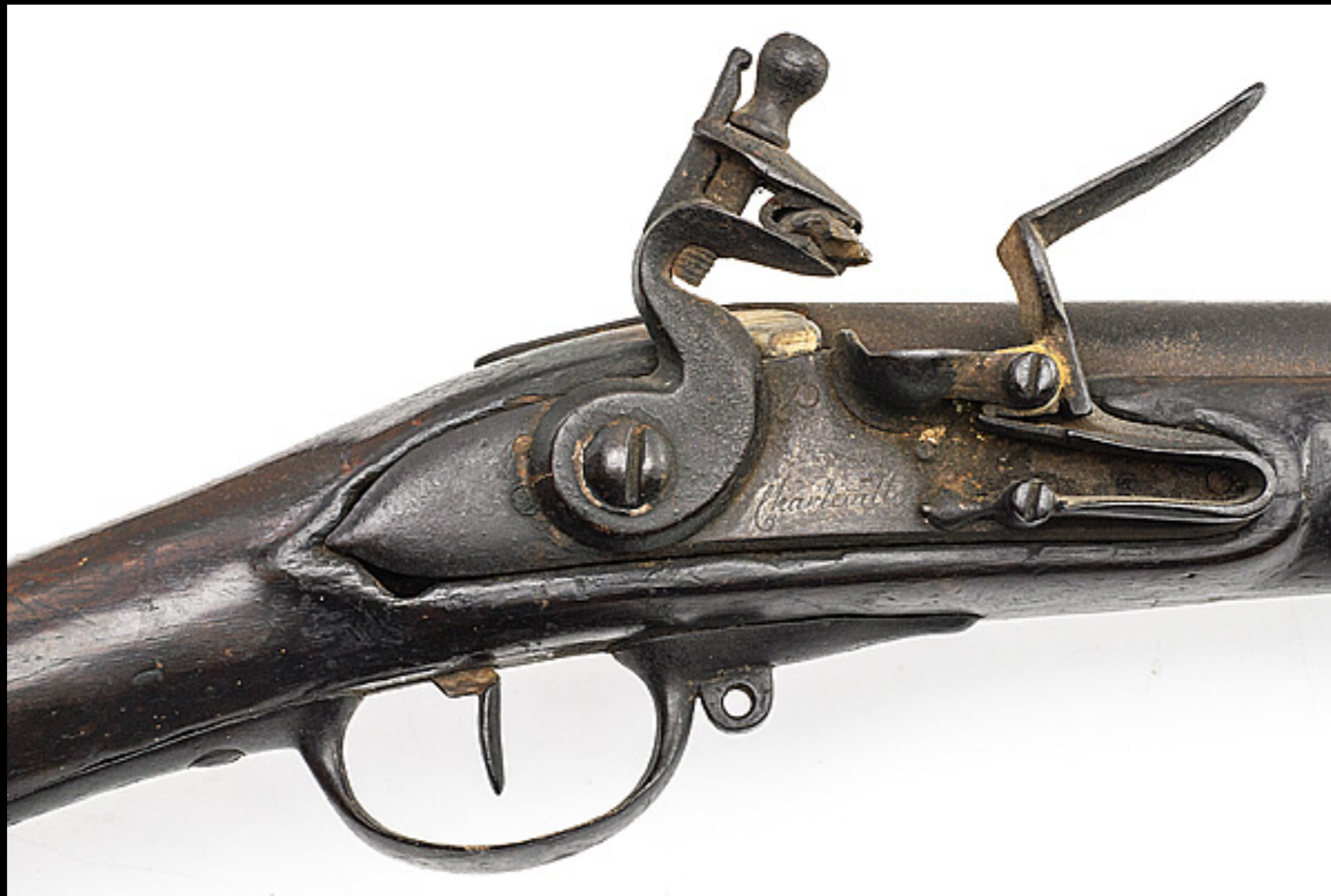
French "Model 1774" Firelock Marked "U. STATES"