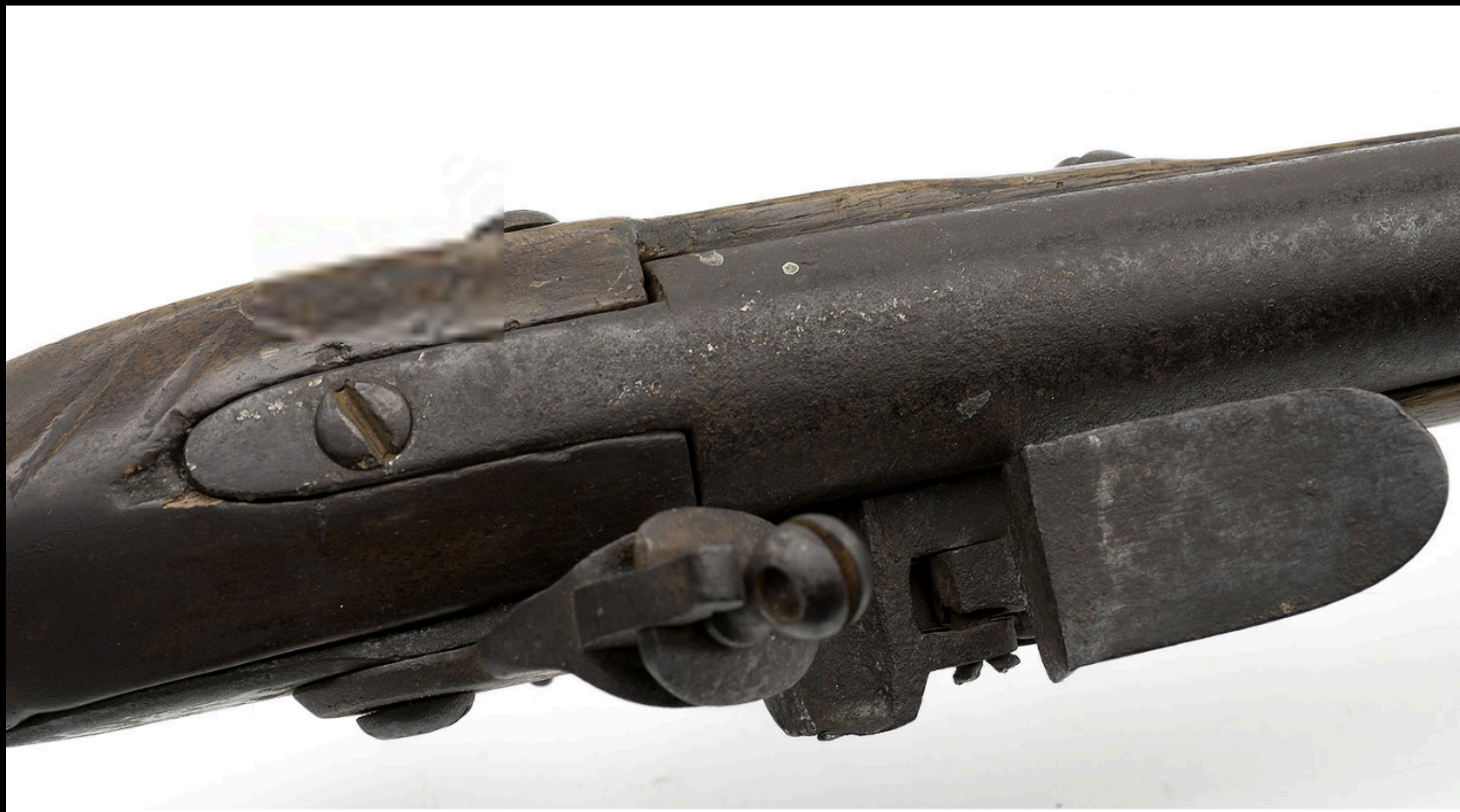
French "Model 1763" Firelock Charleville Armory (Cowan's Auctions)