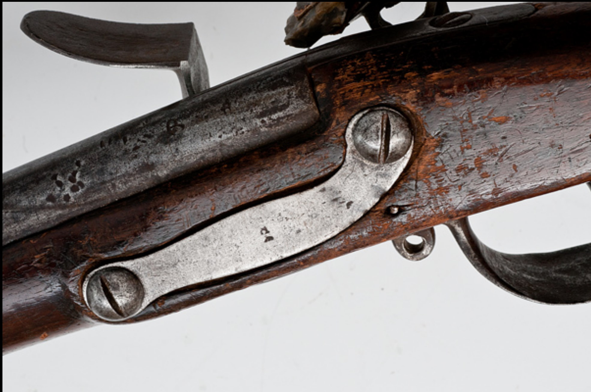
French "Model 1763" Firelock Royal Maulbeuge Armory