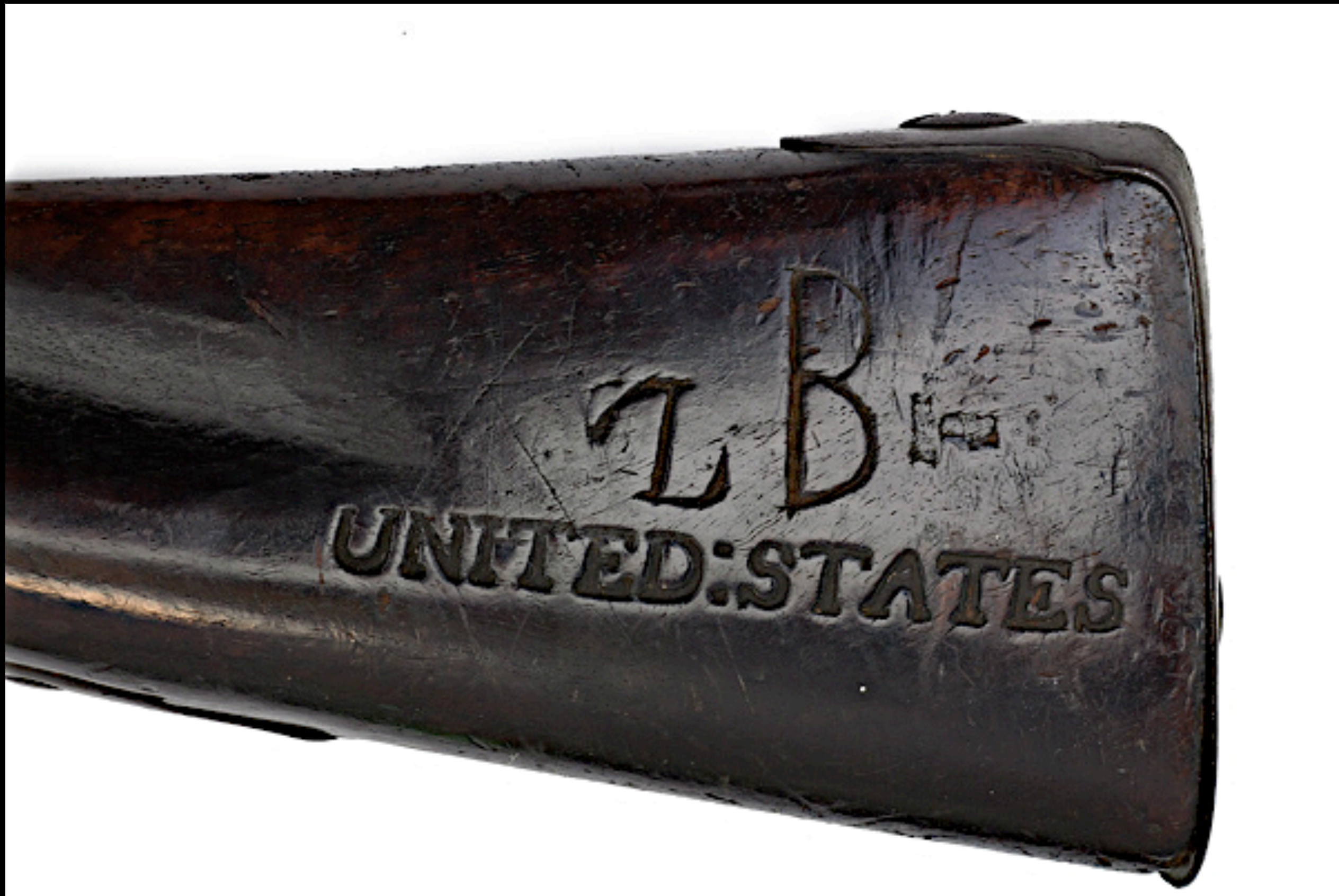
French "Model 1771" Firelock with 1774 Modifications Marked "UNITED STATES" (Cowan's Auctions)