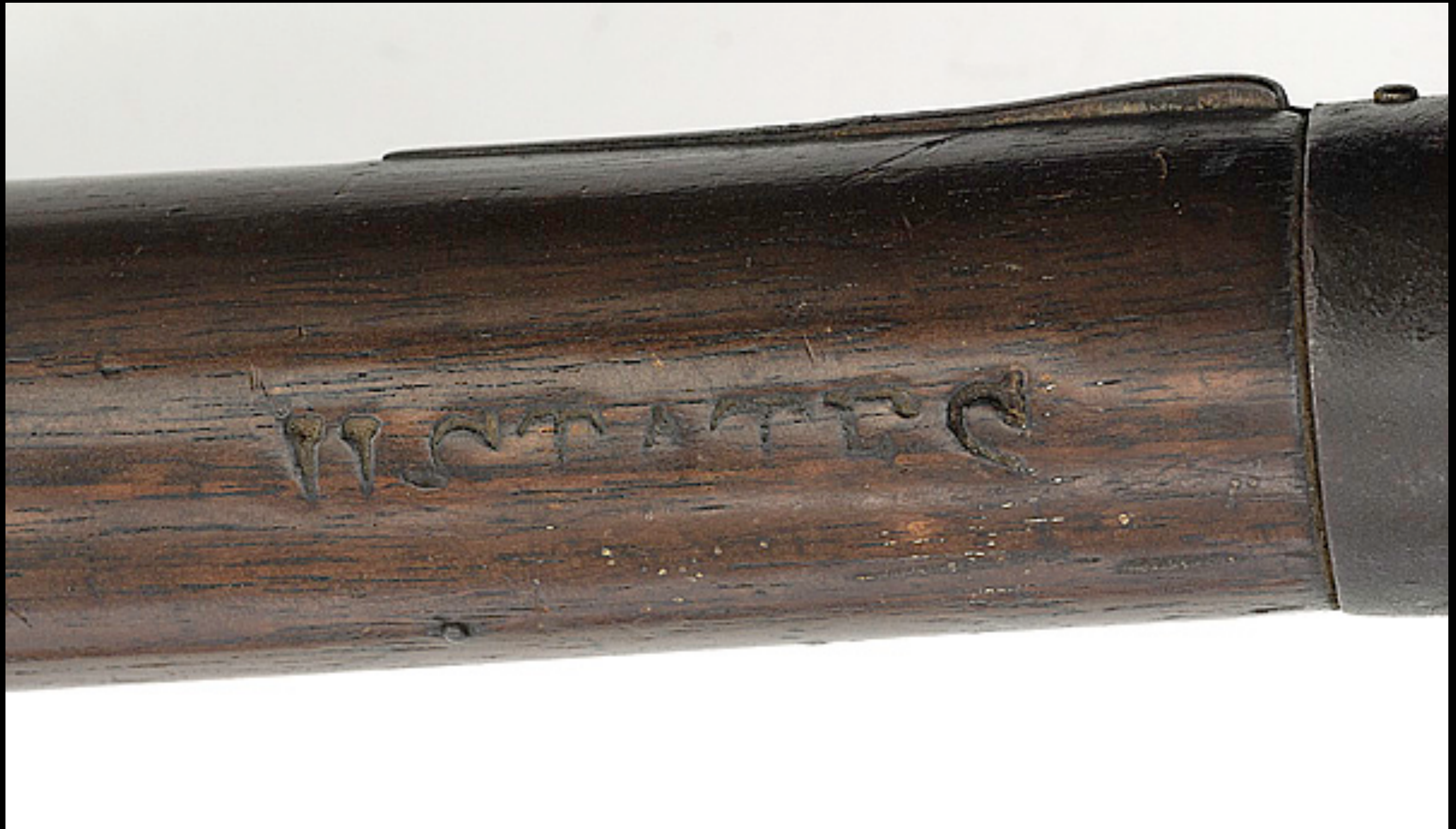
French "Model 1774" Firelock Marked "U. STATES" (Cowan's Auctions)