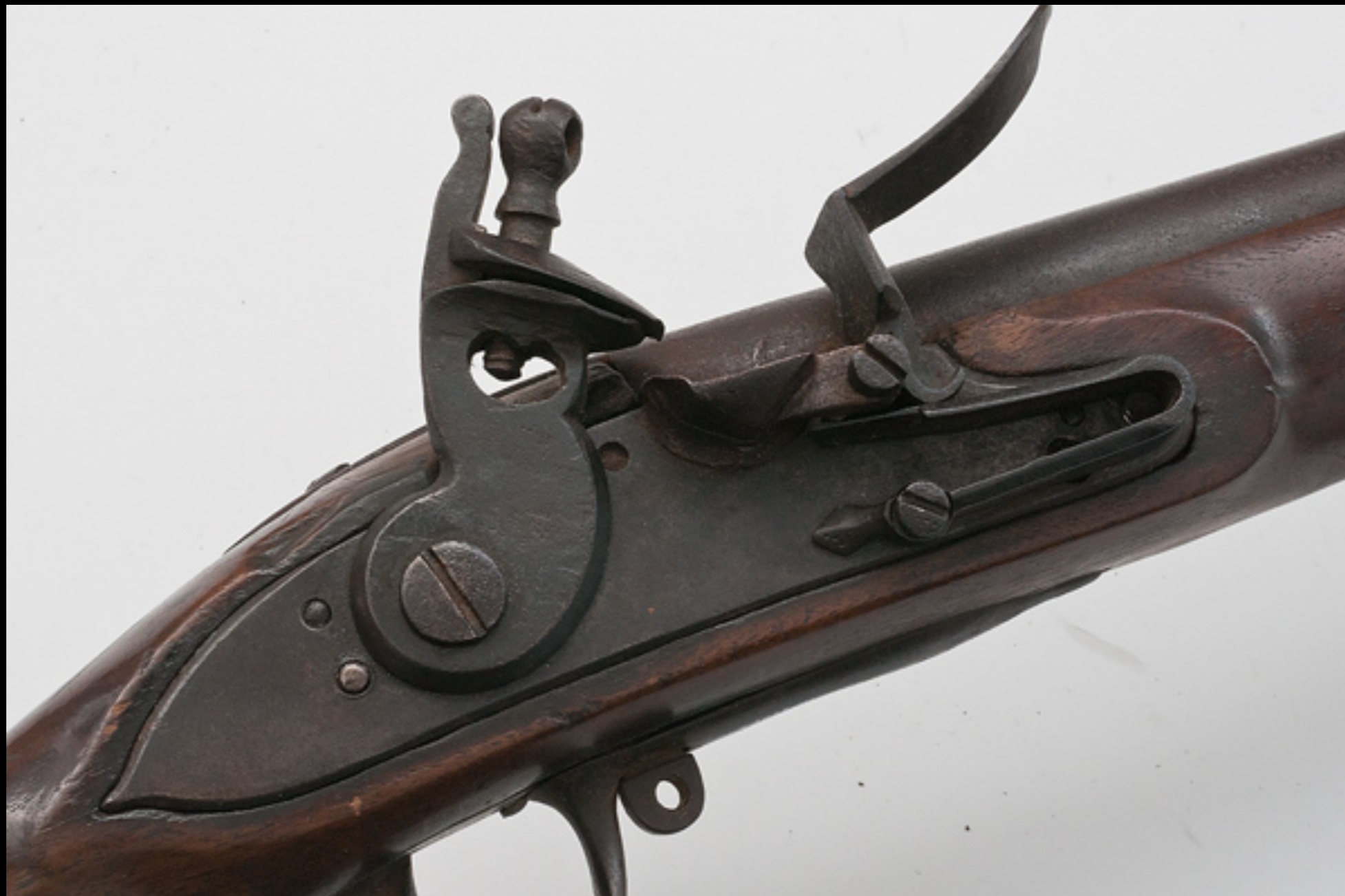
French "Model 1766" Firelock with American Lockplate c. 1766