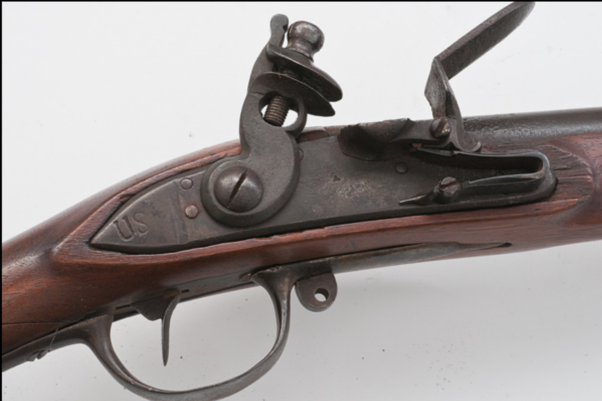
French "Model 1754" Firelock with "U.S." Surcharge New Lock, Trigger, and Barrel of the 1774 Pattern (Cowan's Auctions)