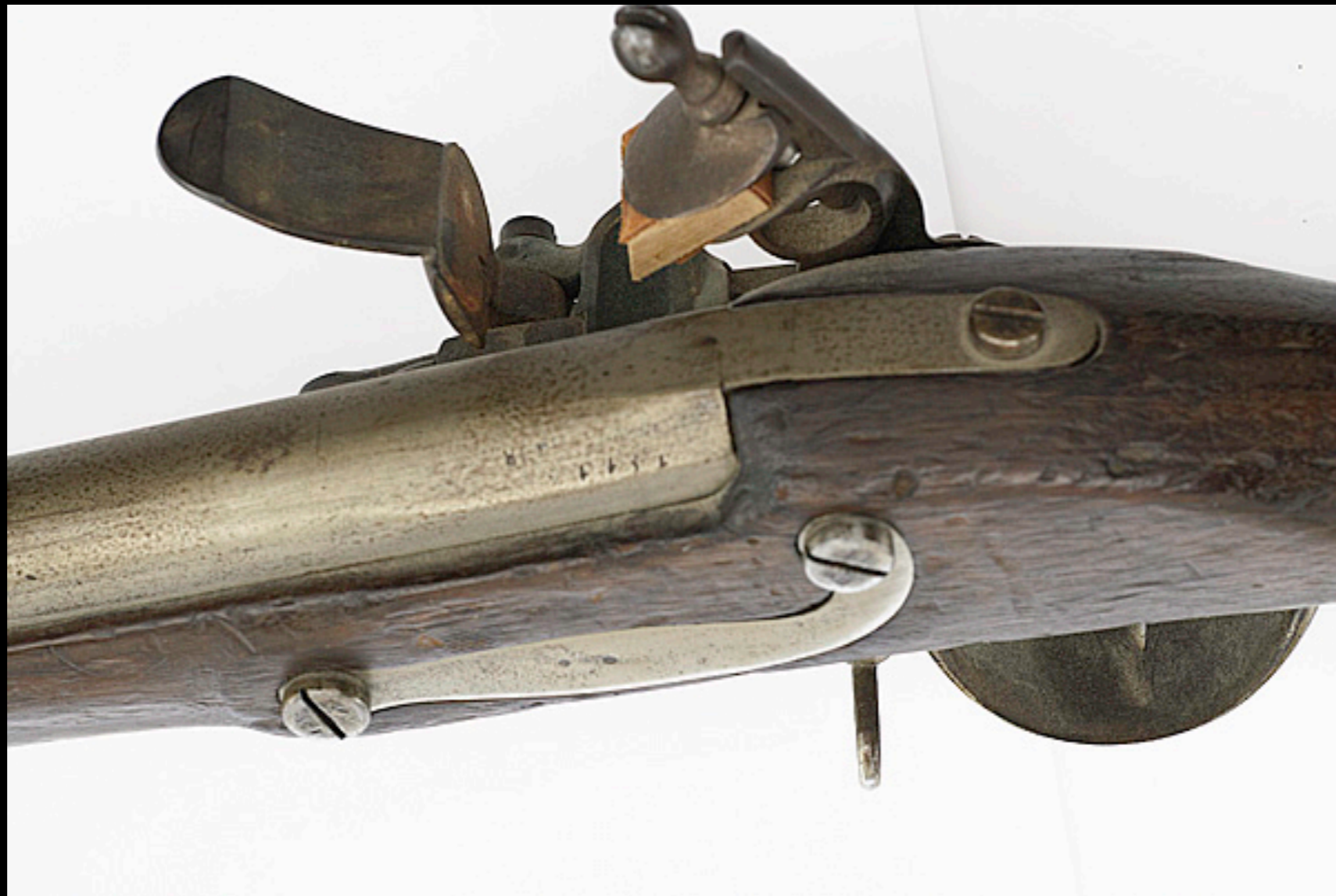
French "Model 1777" Firelock Replaced Ramrod