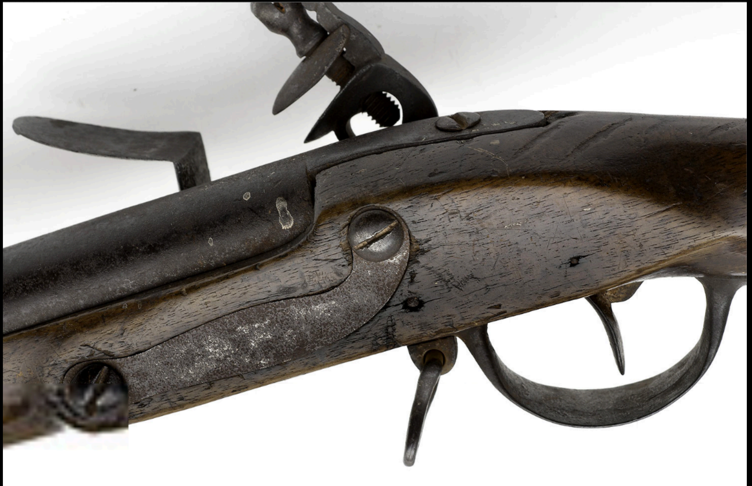
French "Model 1763" Firelock Charleville Armory (Cowan's Auctions)