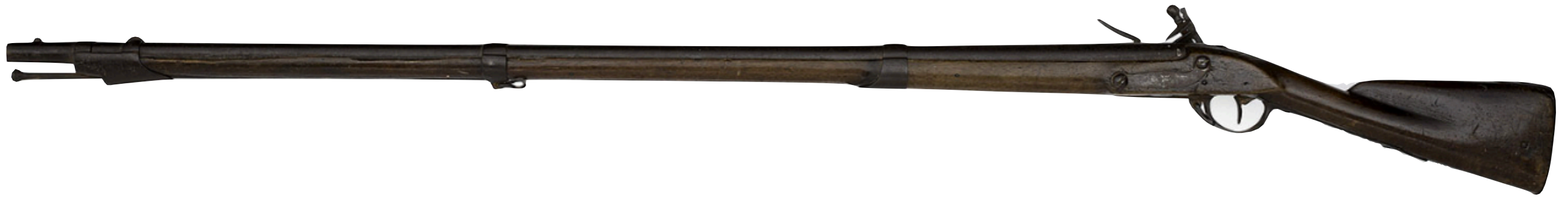
French "Model 1763" Firelock Charleville Armory (Cowan's Auctions)