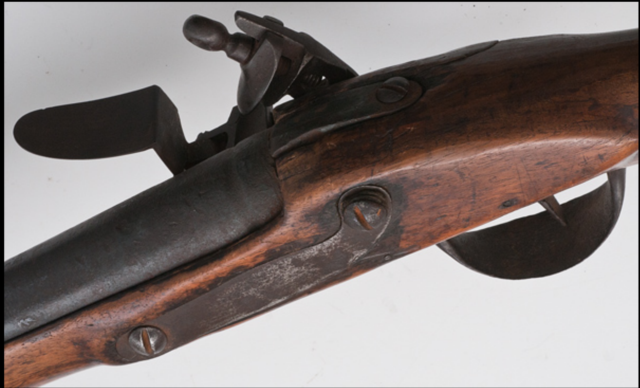
French "Model 1754" Firelock with American Lockplate Attributed to the Continental Gun Manufactory in Philadelphia - U.S. Surcharge on Barrel