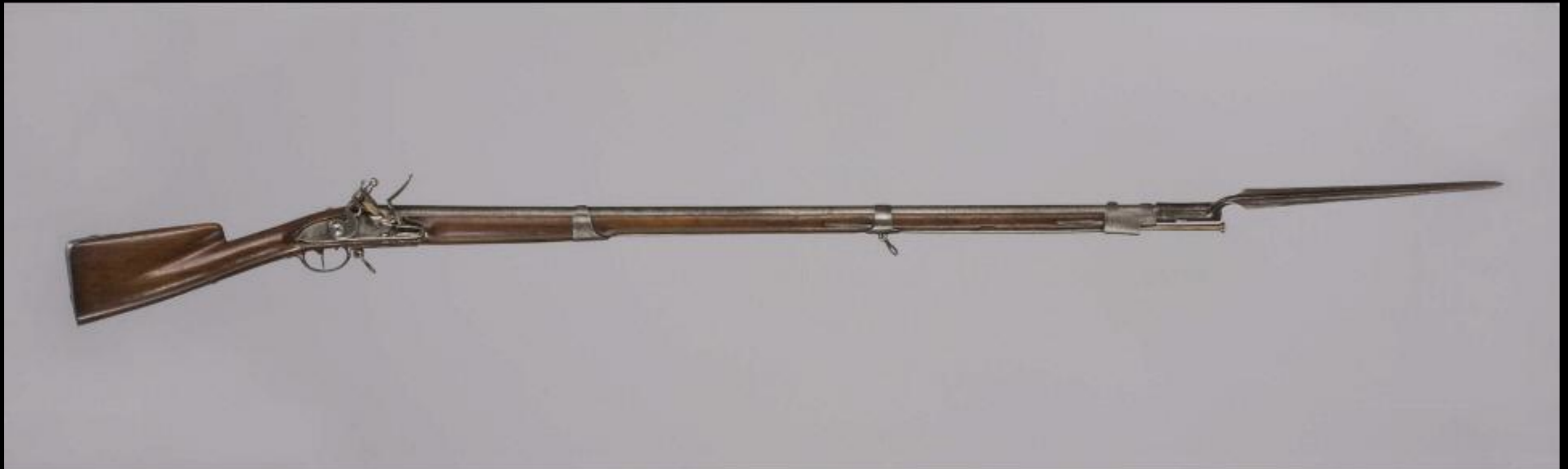
French "Model 1763" Firelock Royal Manufactory at Mauberge (Colonial Williamsburg Foundation)