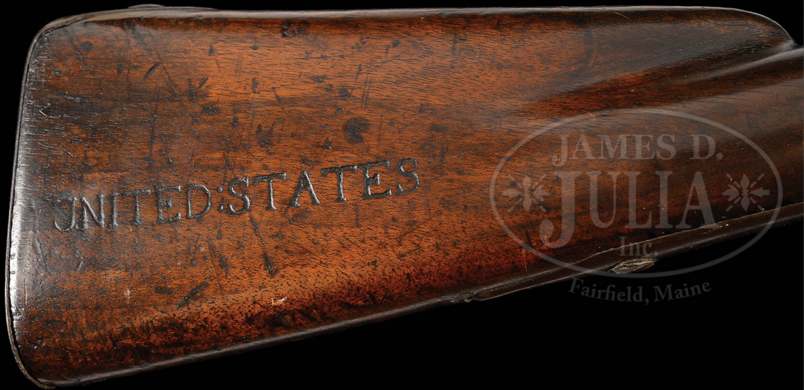
French "Model 1774" Firelock Marked "UNITED STATES" Charleville Armory