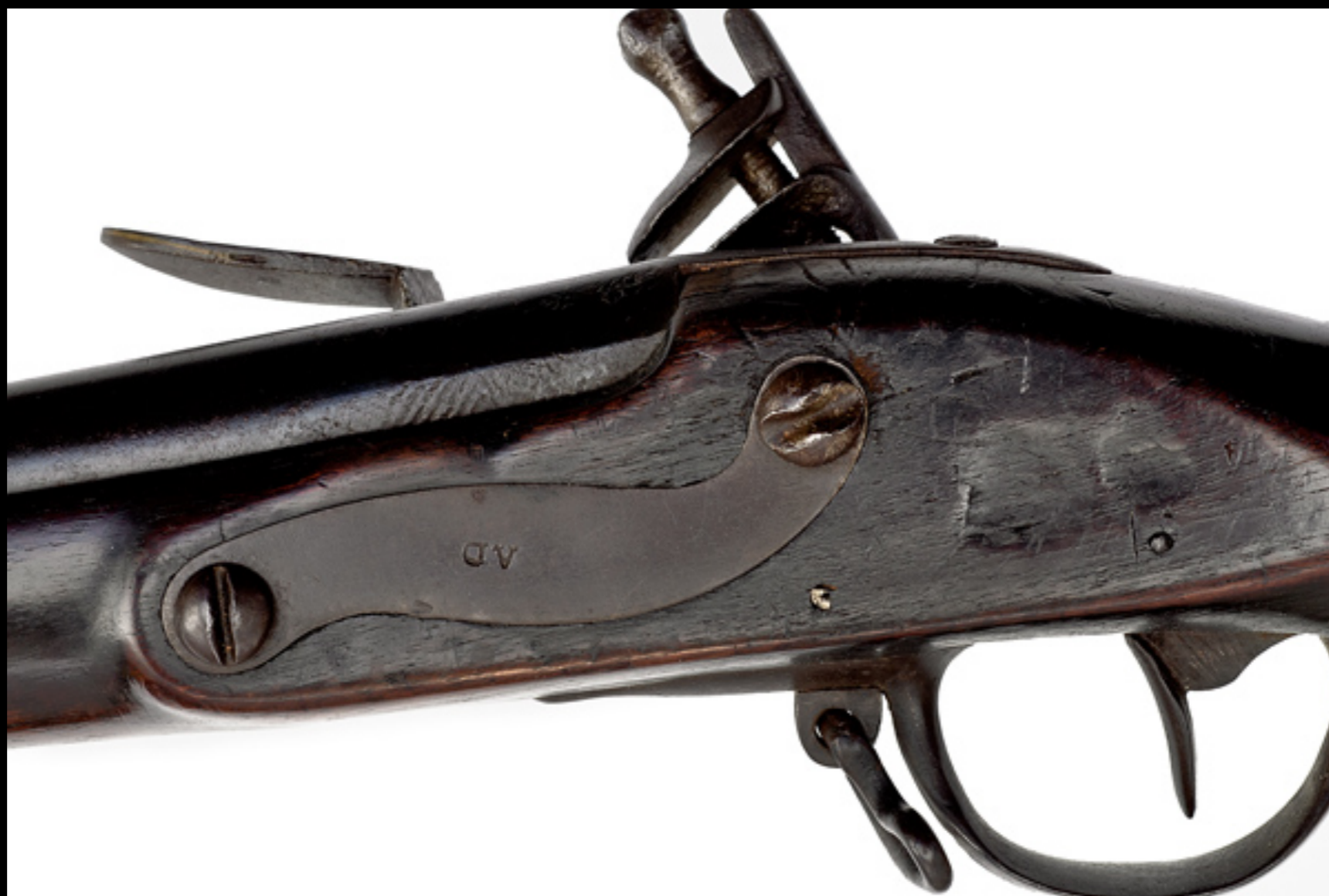
French "Model 1771" Firelock with 1774 Modifications Marked "UNITED STATES"