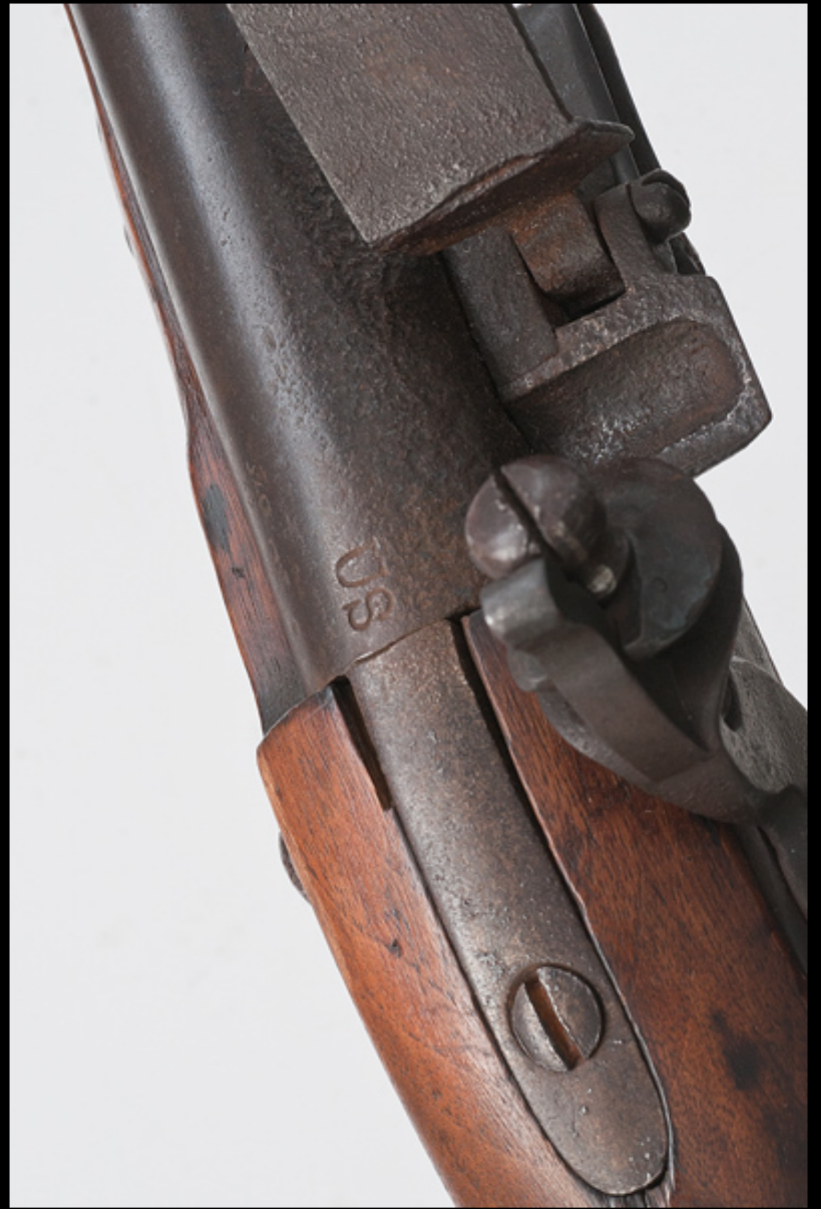
French "Model 1754" Firelock with "U.S." Surcharge New Lock, Trigger, and Barrel of the 1774 Pattern