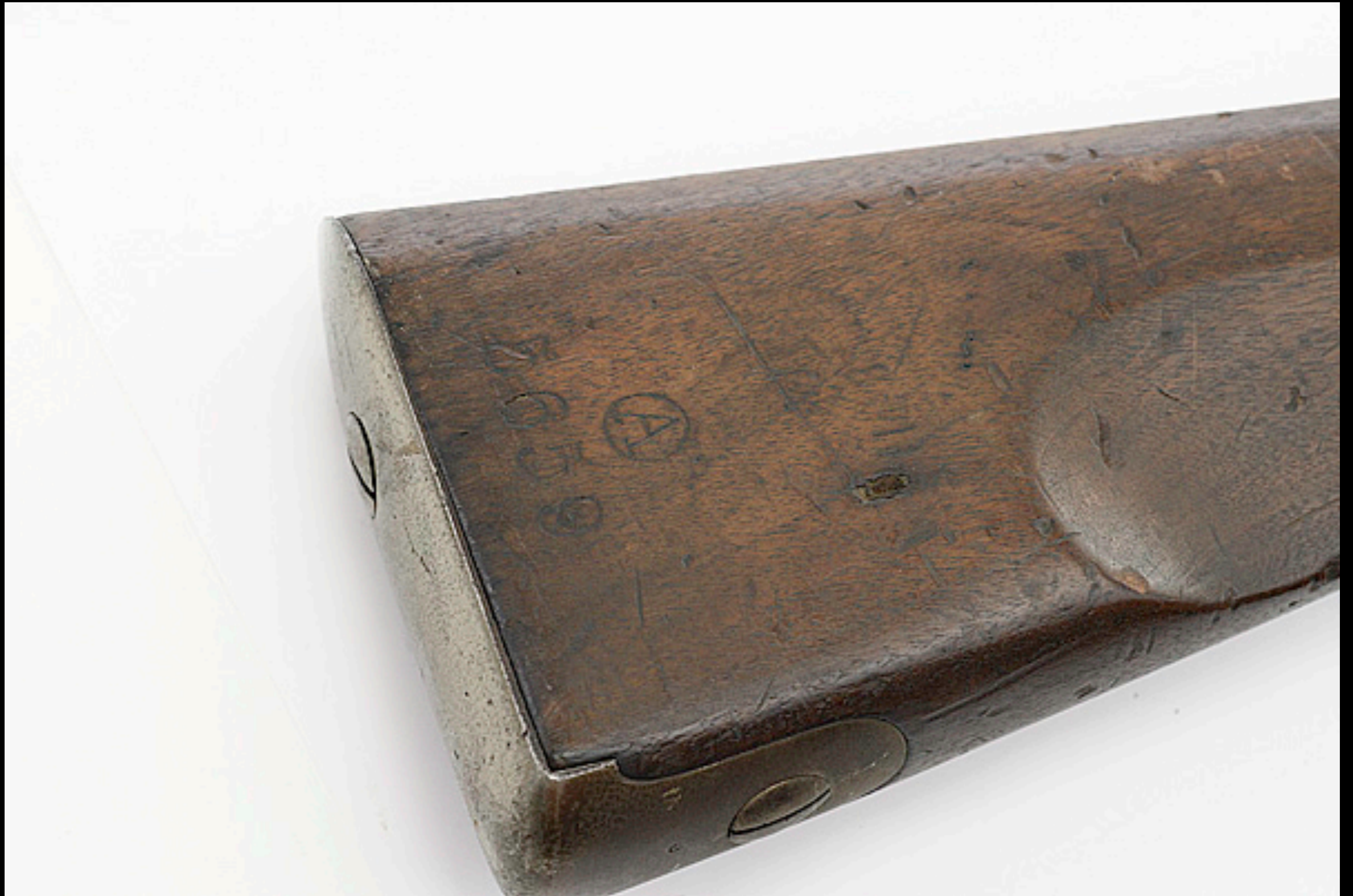
French "Model 1777" Firelock Replaced Ramrod (Cowan's Auctions)