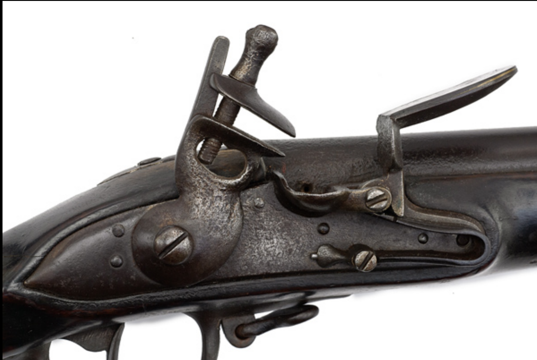
French "Model 1771" Firelock with 1774 Modifications Marked "UNITED STATES"