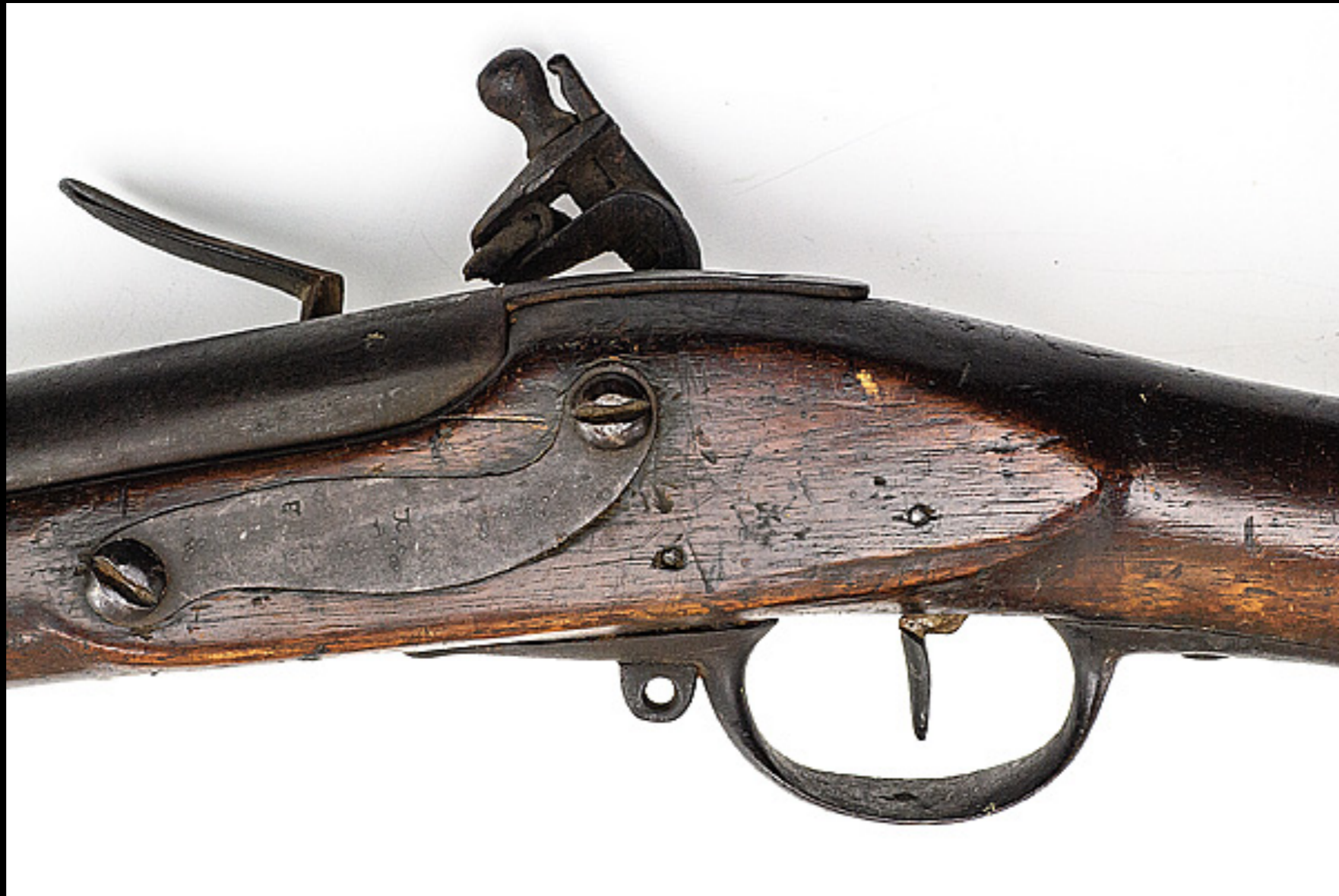
French "Model 1774" Firelock Marked "U. STATES" (Cowan's Auctions)