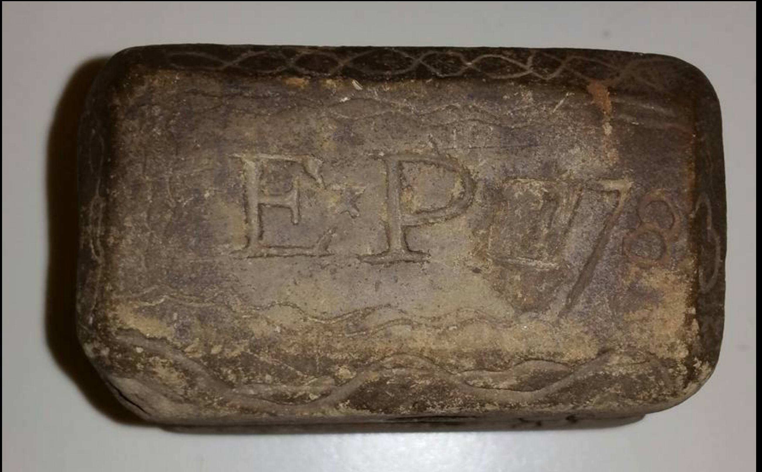
Stone Ball Mold Engraved "E P 1783"