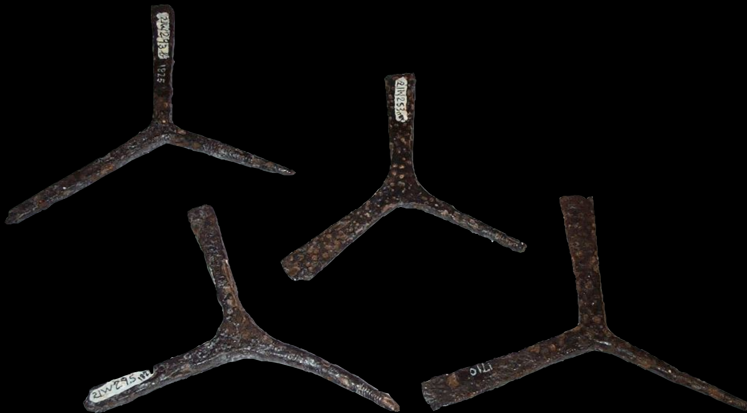
British Triangular Musket Tools Found in the Camp of H.M. 21st Regiment of Foot (Saratoga National Historic Park)