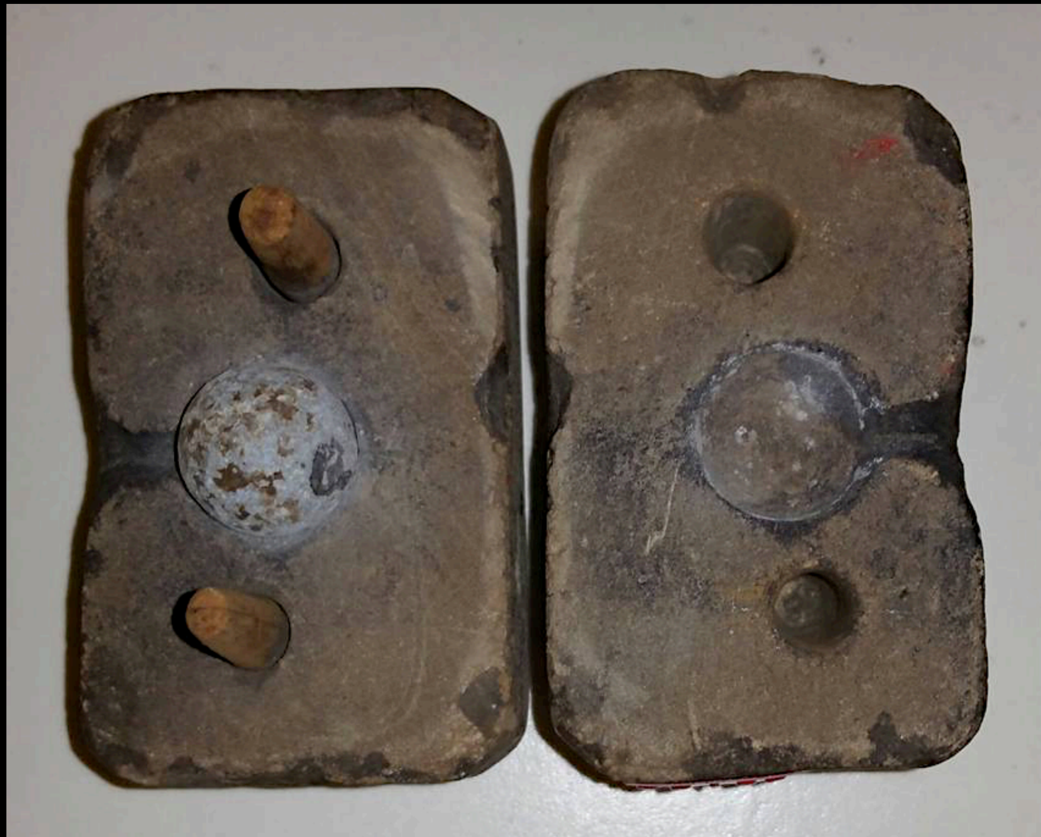
Stone Ball Mold Engraved "E P 1783"