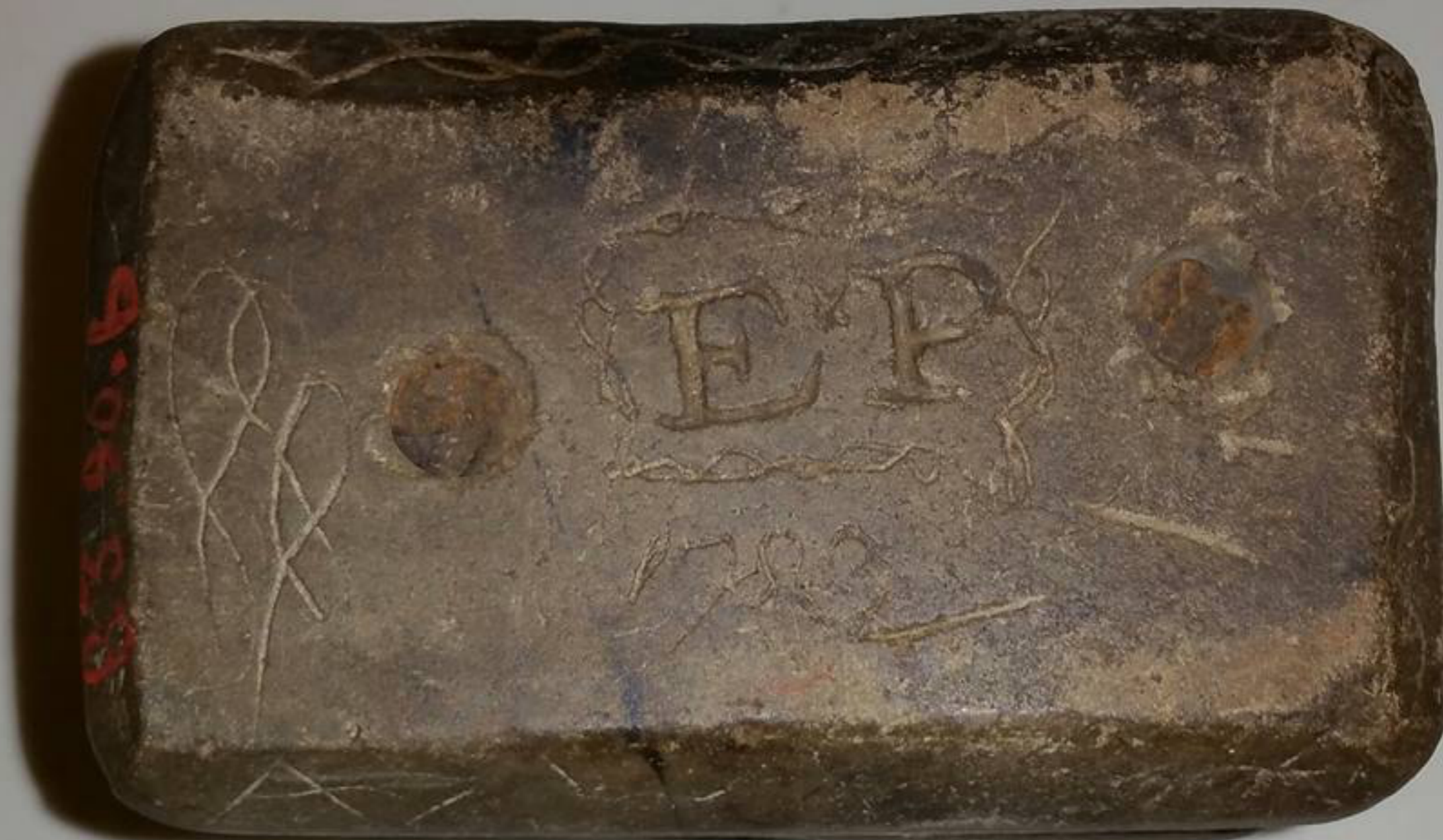
Stone Ball Mold Engraved "E P 1783" (Bostonian Society -)