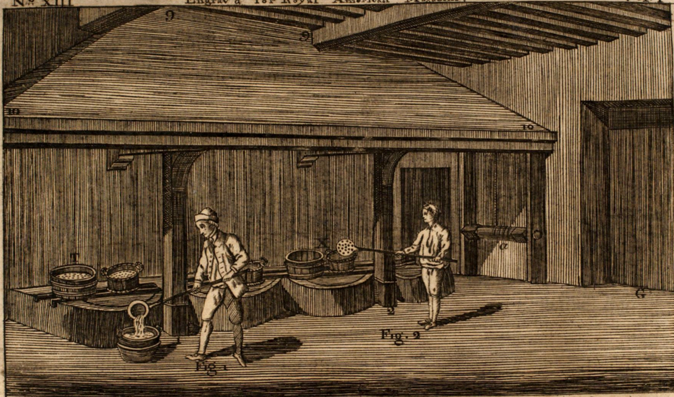
The Method of Refining Salt-Petre.