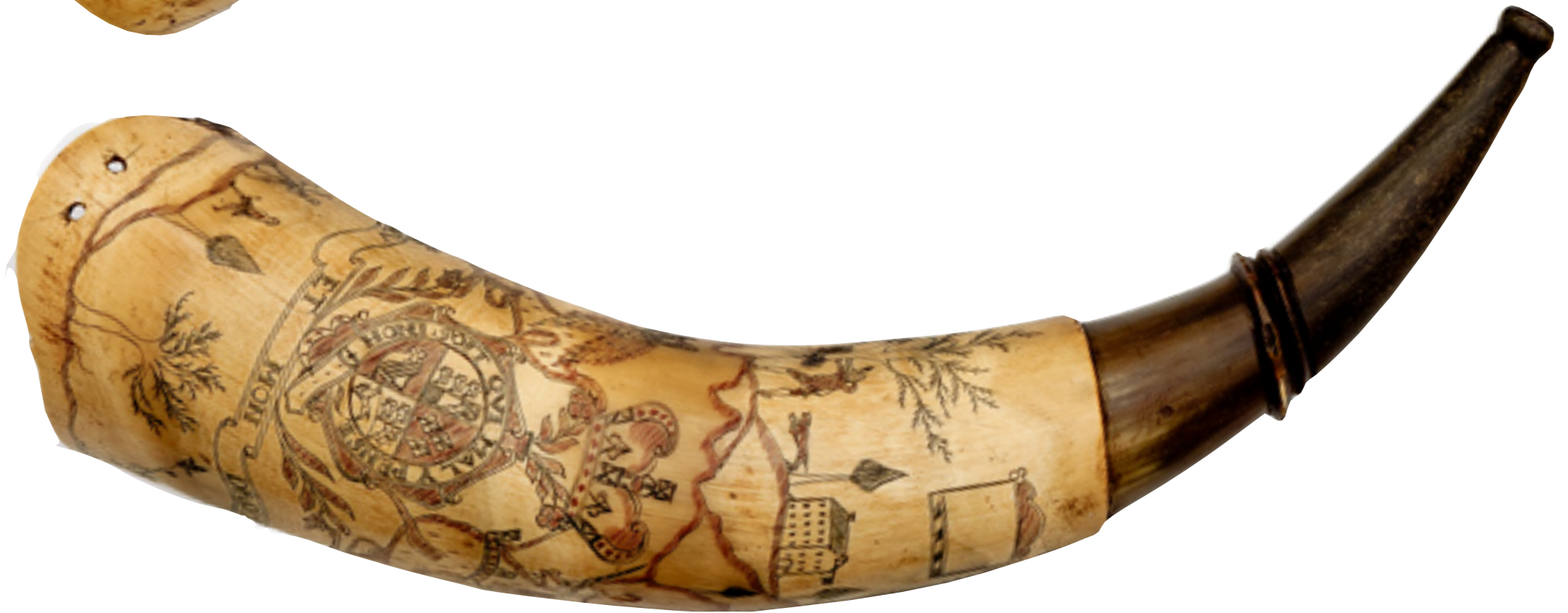
Powder Horn c. 1760