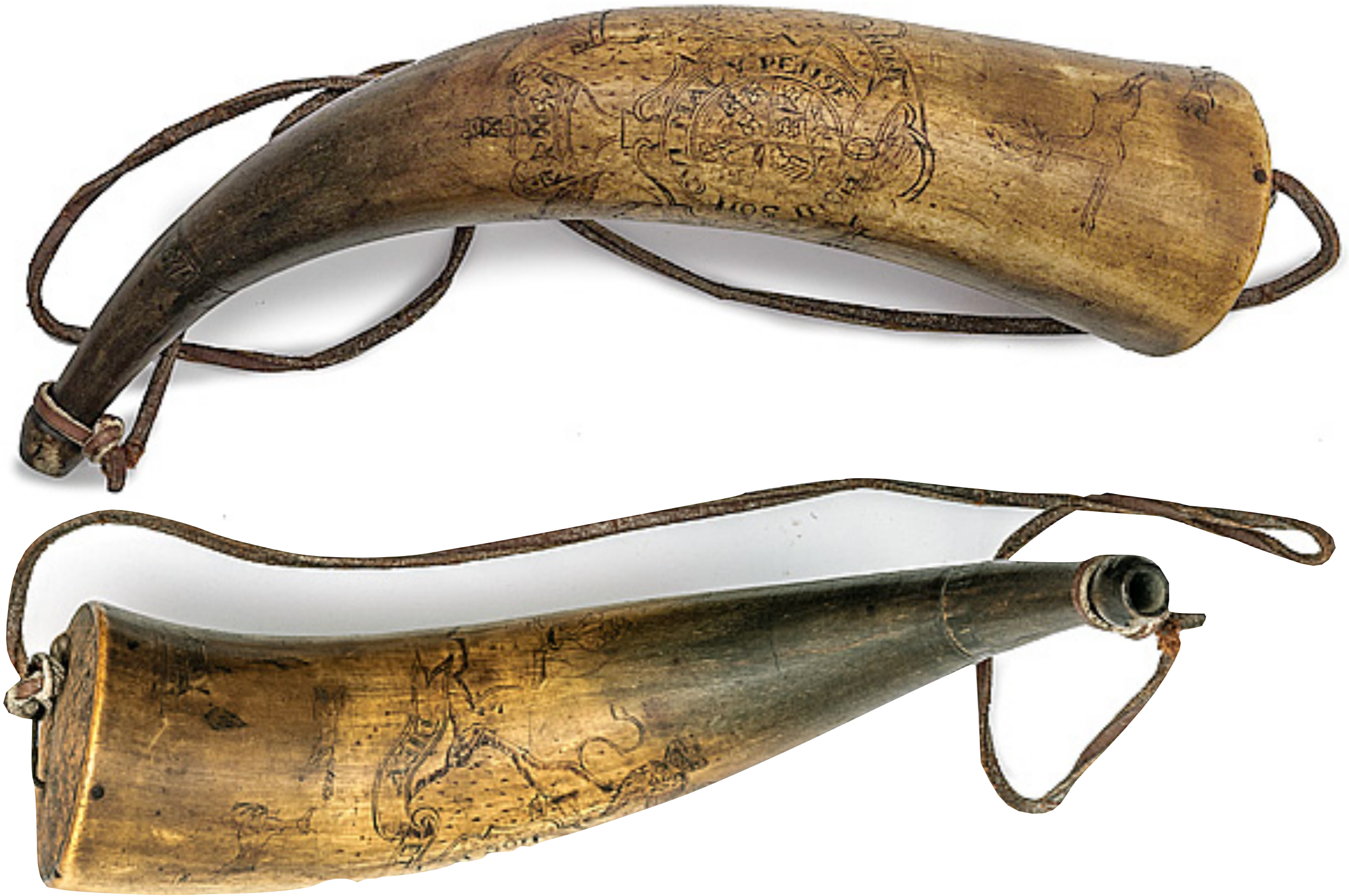
Powder Horn with British Coat of Arms Date Uncertain