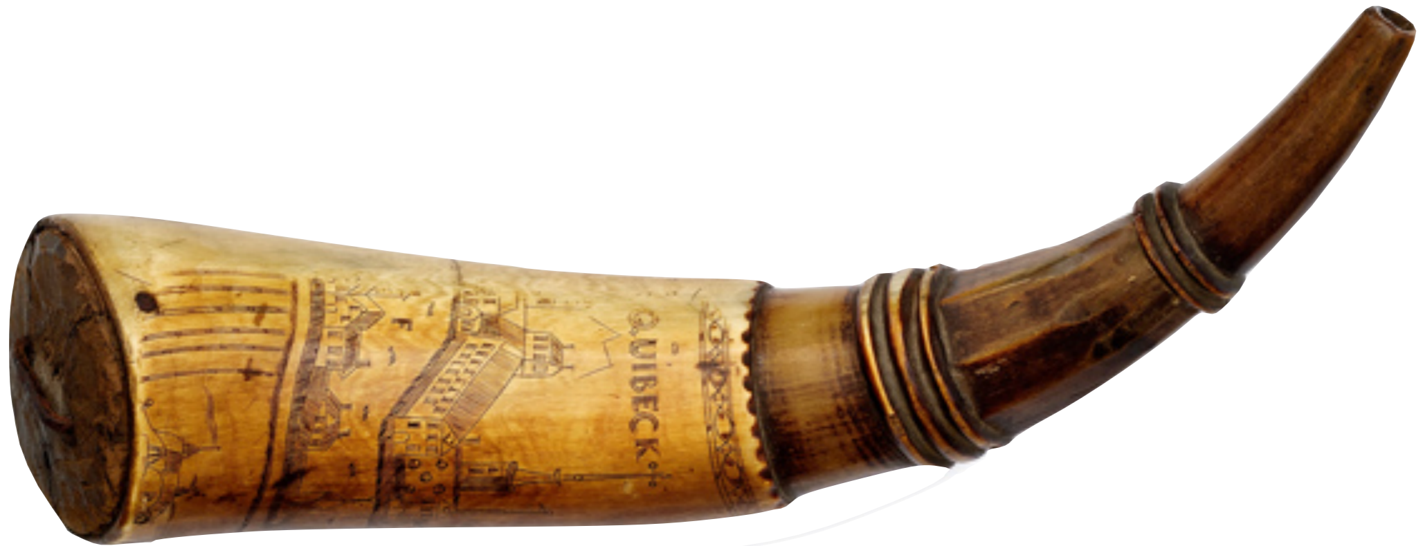
Powder Horn of Quebec Initialed "H H E"