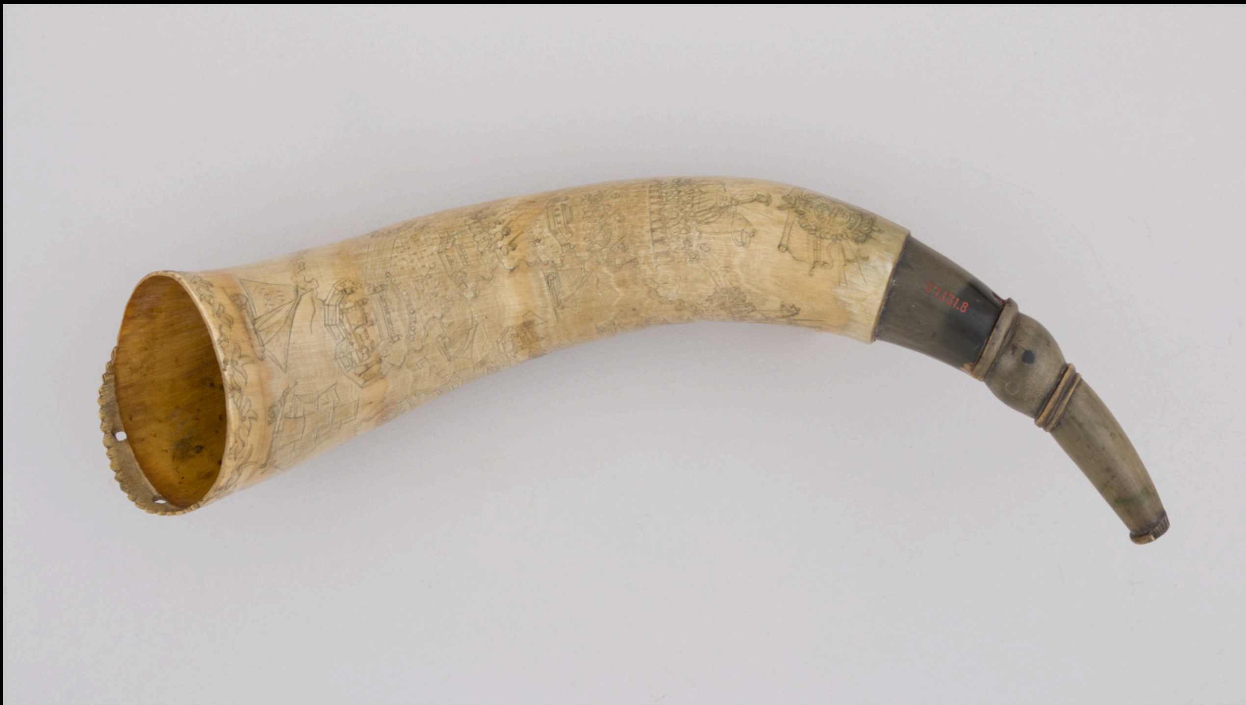
Powder Horn Engraved with a View of Havana, Cuba, Captured by British Forces in 1762. c. 1765 (Metropolitan Museum of Art)