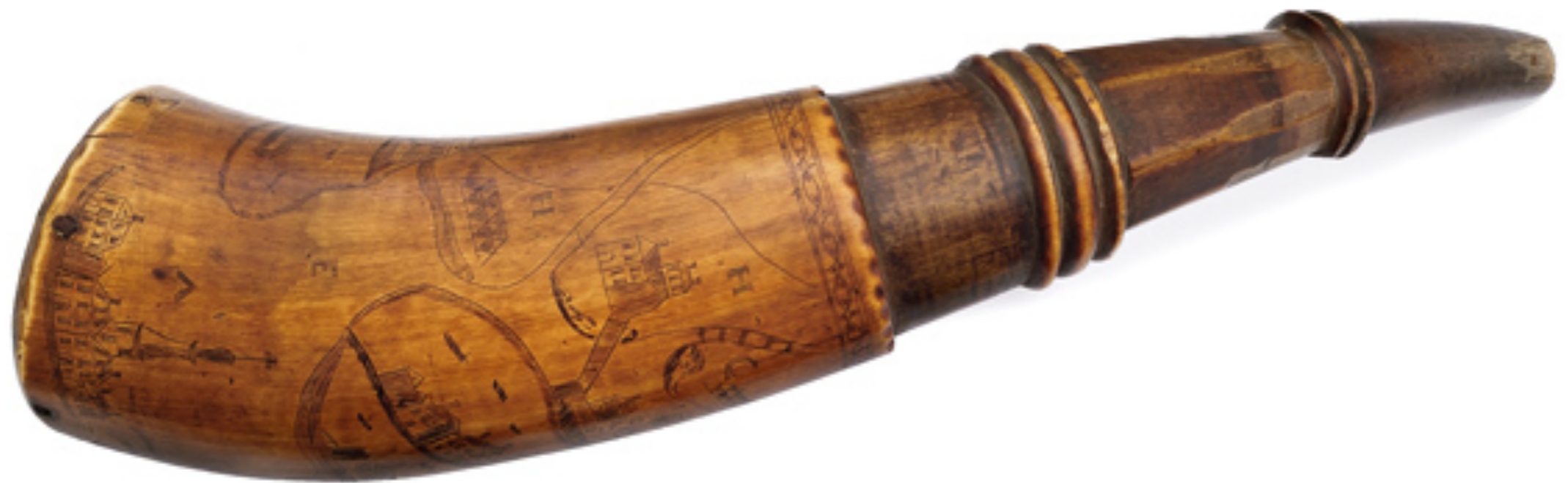
Powder Horn of Quebec Initialed "H H E"