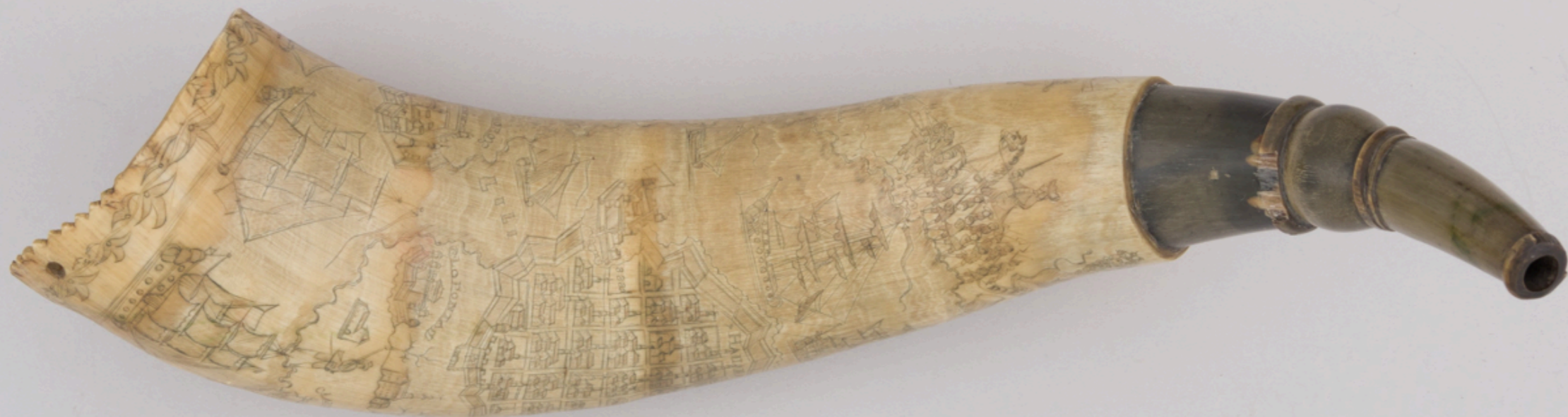
Powder Horn Engraved with a View of Havana, Cuba, Captured by British Forces in 1762. c. 1765 (Metropolitan Museum of Art)