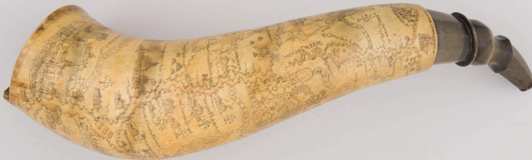
Powder Horn Depicting Rome, New York, and Fort Stanwix 1761 (Metropolitan Museum of Art)