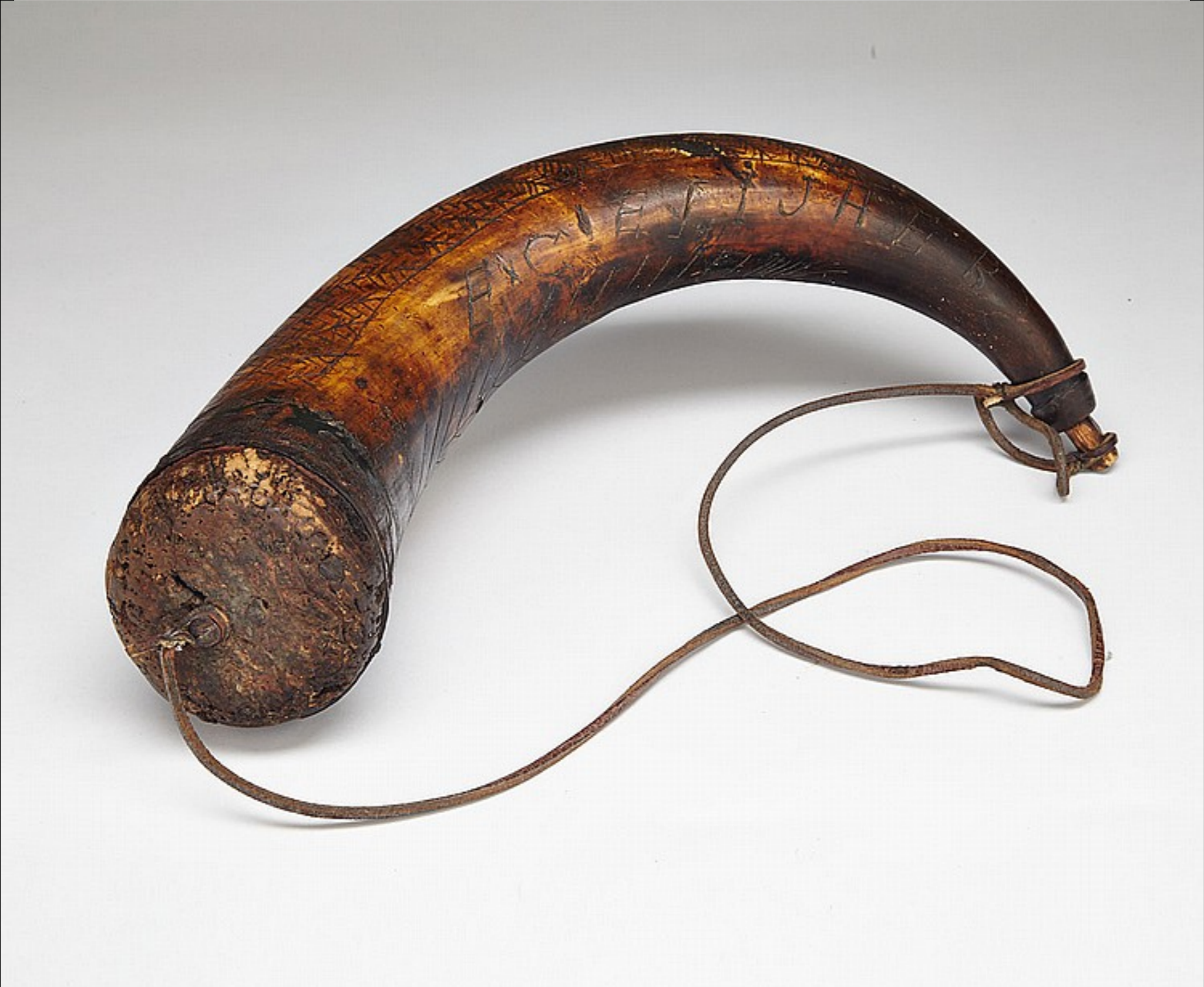
Powder Horn 2nd Half 18th Century (Cowan's Auctions)