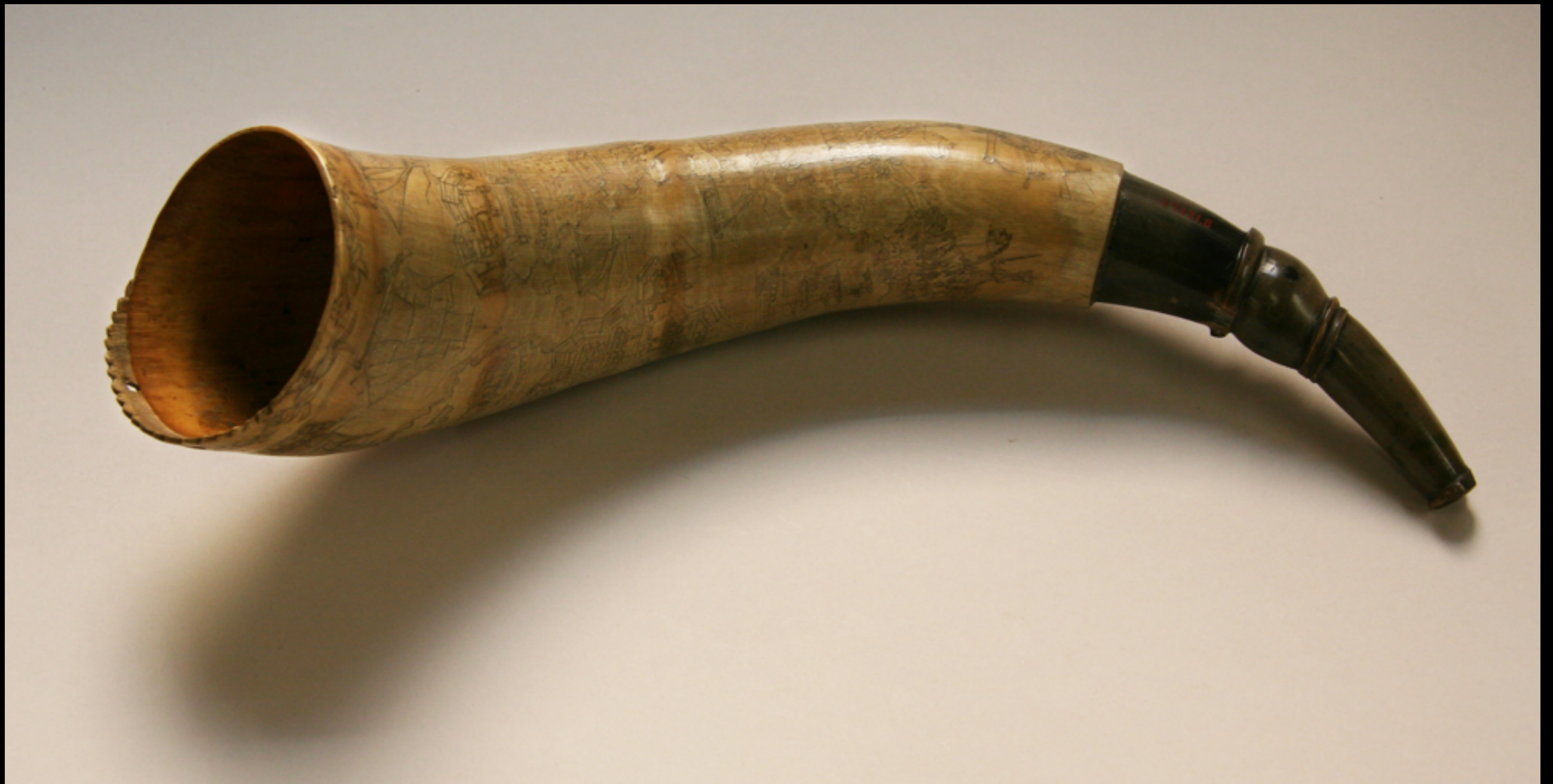
Powder Horn Engraved with a View of Havana, Cuba, Captured by the British Forces in 1762 1765 (Metropolitan Museum of Art)