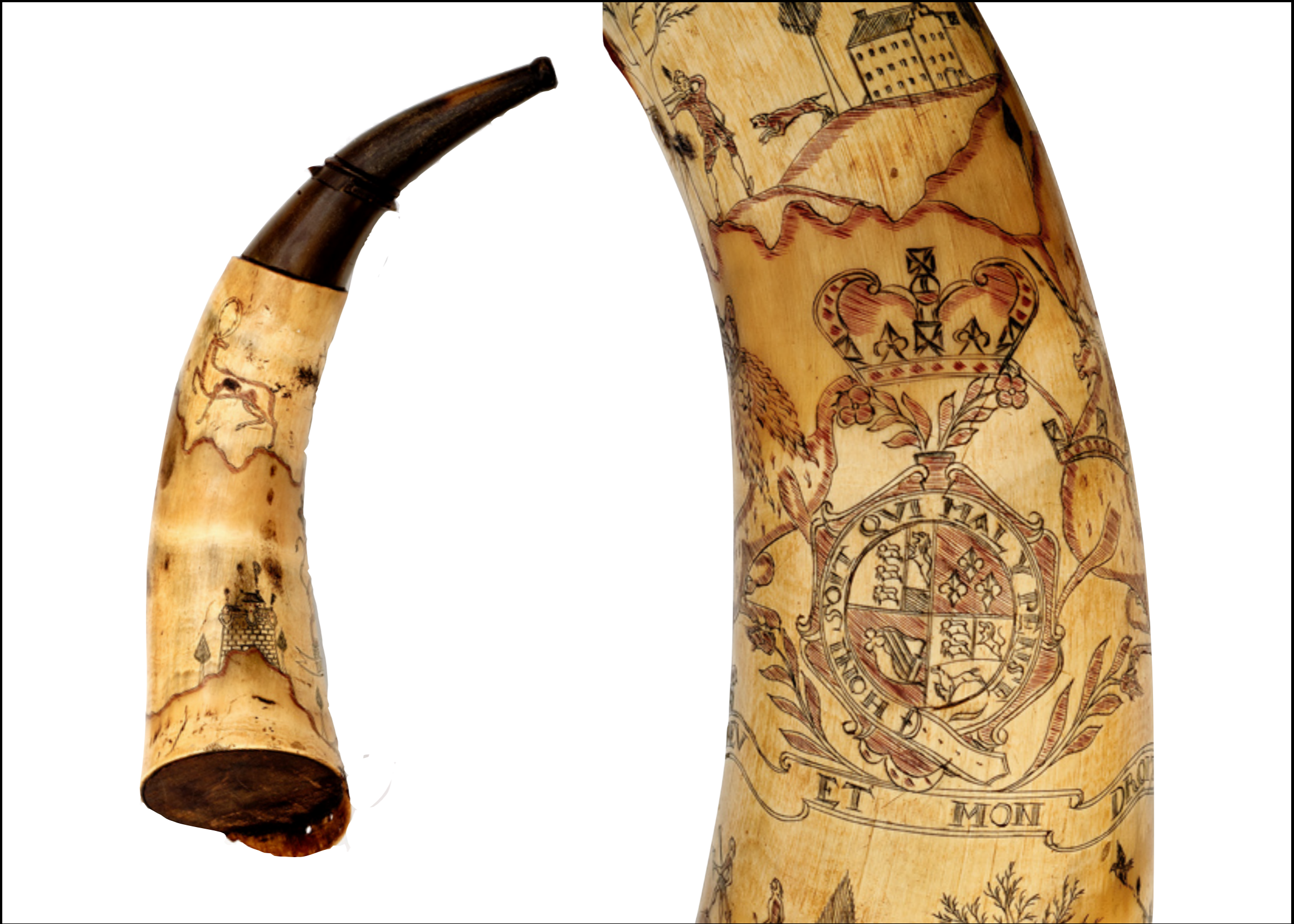
Powder Horn c. 1760