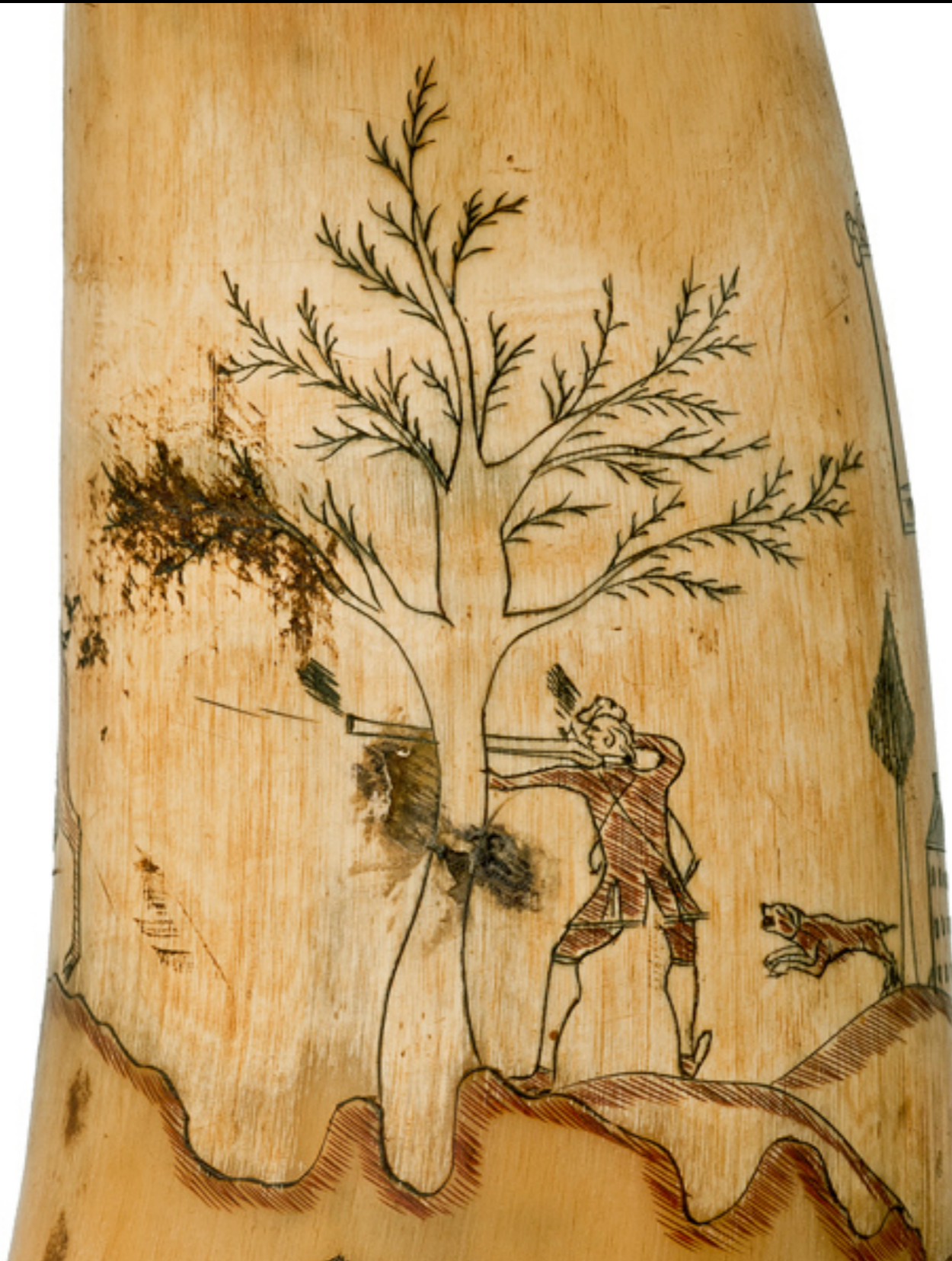
Powder Horn c. 1760