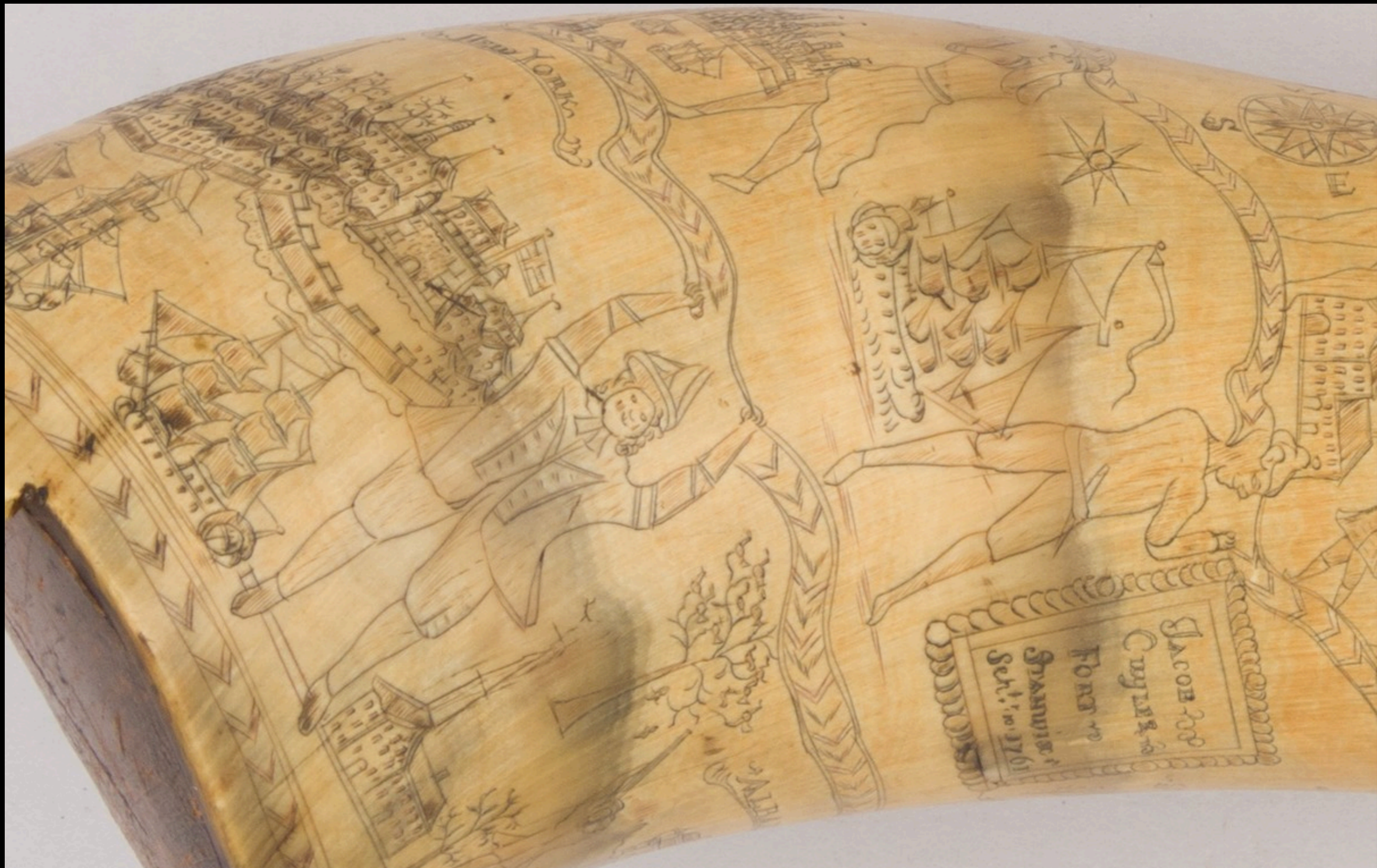
Powder Horn Depicting Rome, New York, and Fort Stanwix 1761 (Metropolitan Museum of Art)