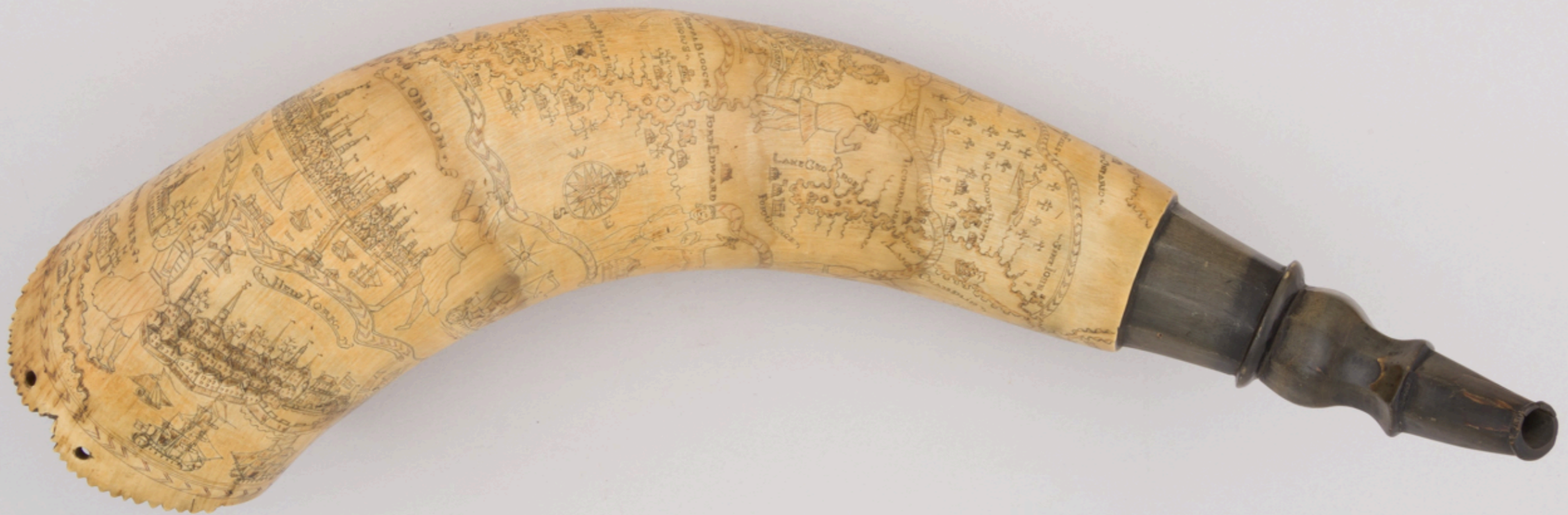
Powder Horn Depicting Rome, New York, and Fort Stanwix 1761 (Metropolitan Museum of Art)