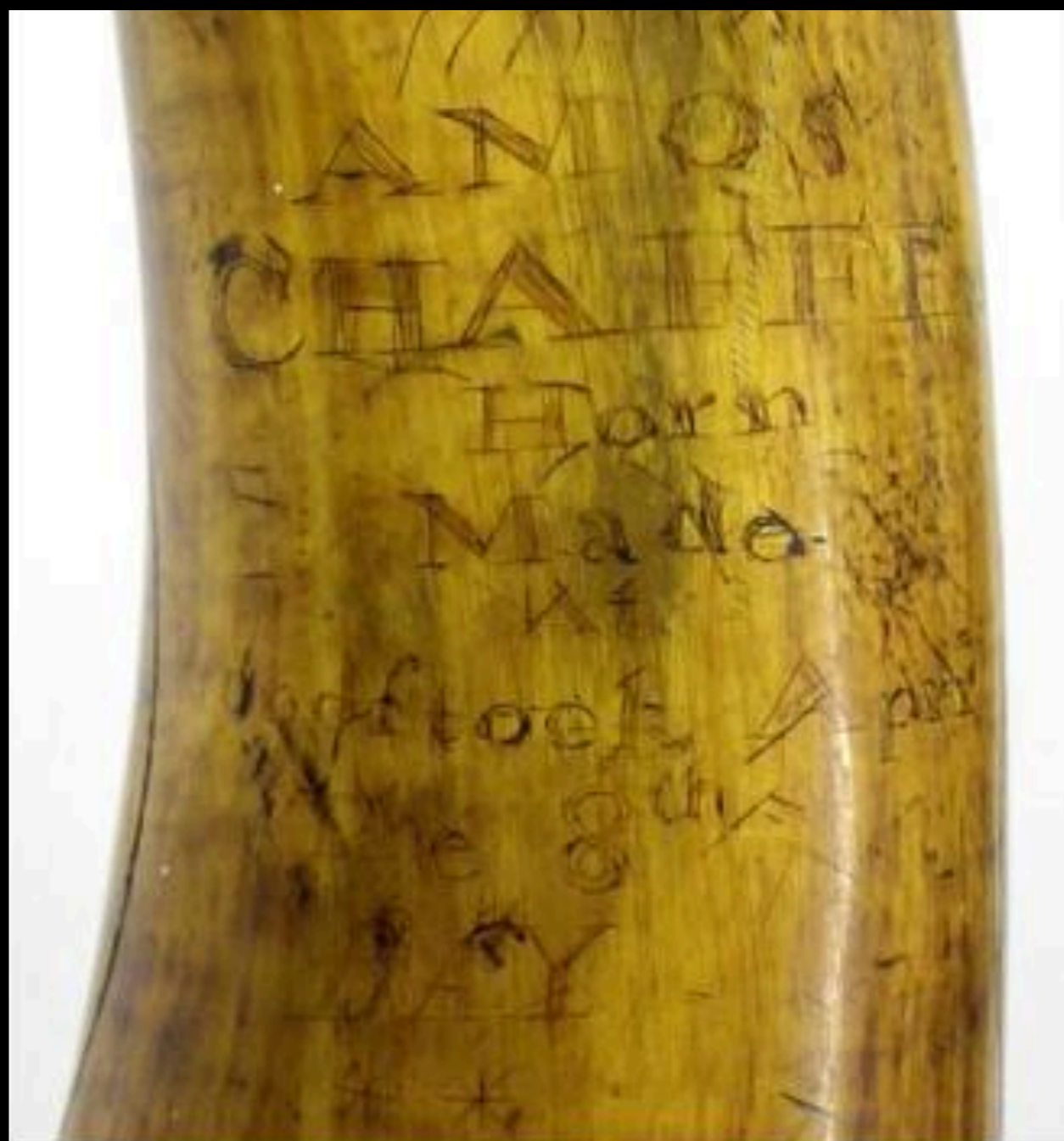
Powder Horn of Amos Chaffee of Woodstock, Connecticut April 8, 1762 (Fort Ticonderoga)