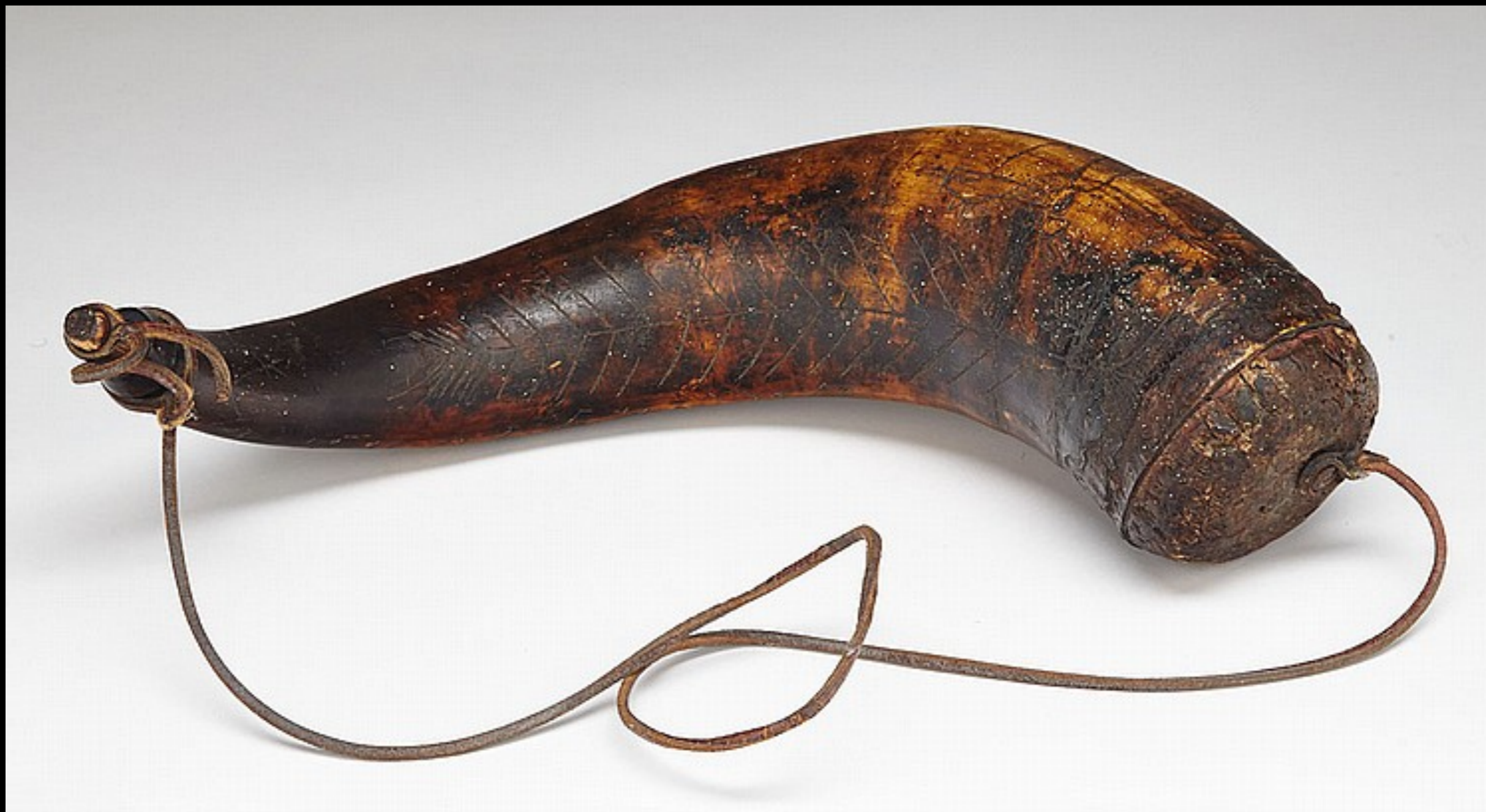
Powder Horn 2nd Half 18th Century