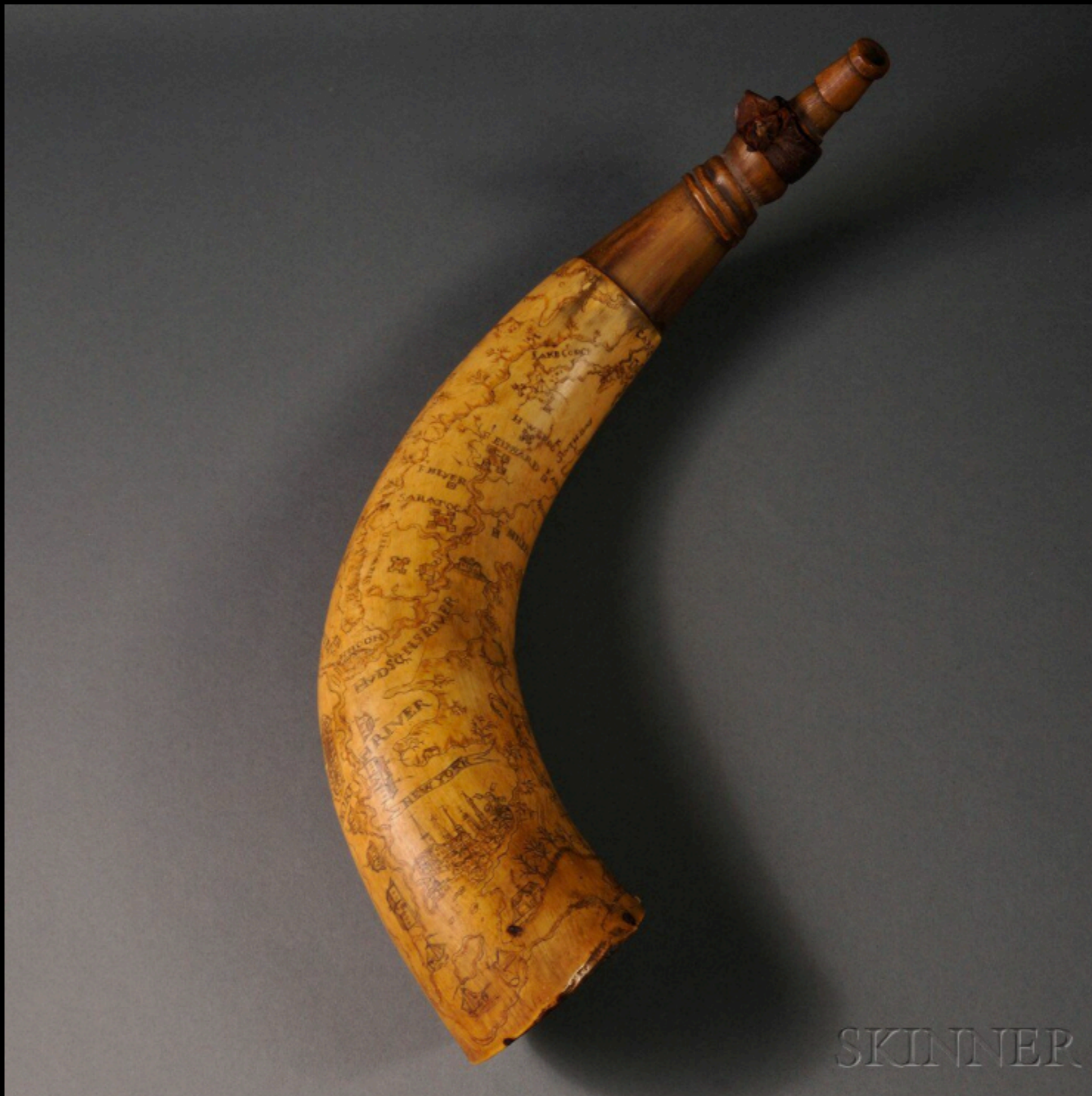
Powder Horn Engraved with Scenes of New York c. 1760 (Skinner)