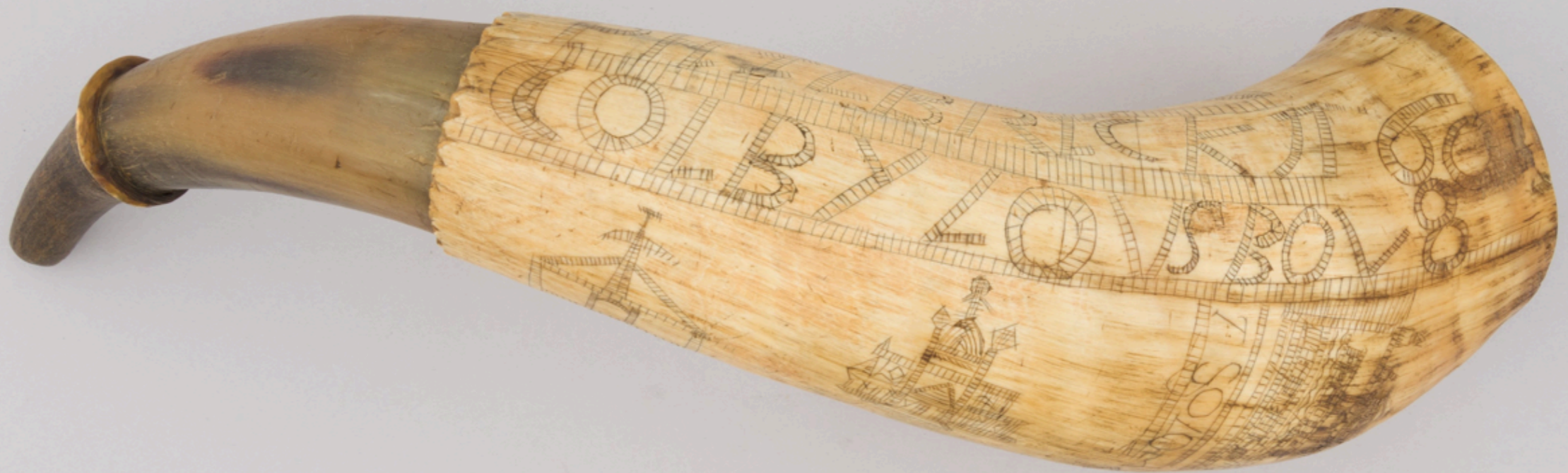
Powder Horn with Views of Saint Paul's Church and Fort Solom 1760 (Metropolitan Museum of Art)