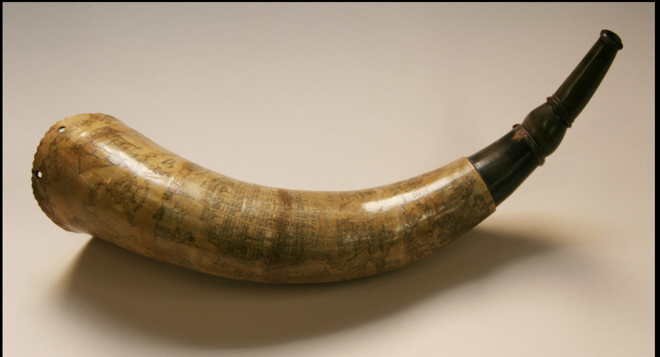
Powder Horn Engraved with a View of Havana, Cuba, Captured by the British Forces in 1762 1765 (Metropolitan Museum of Art)