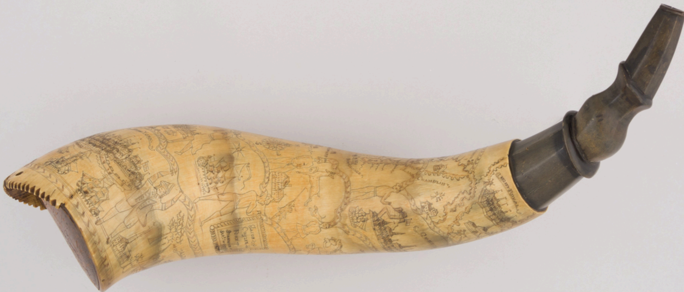
Powder Horn Depicting Rome, New York, and Fort Stanwix 1761 (Metropolitan Museum of Art)