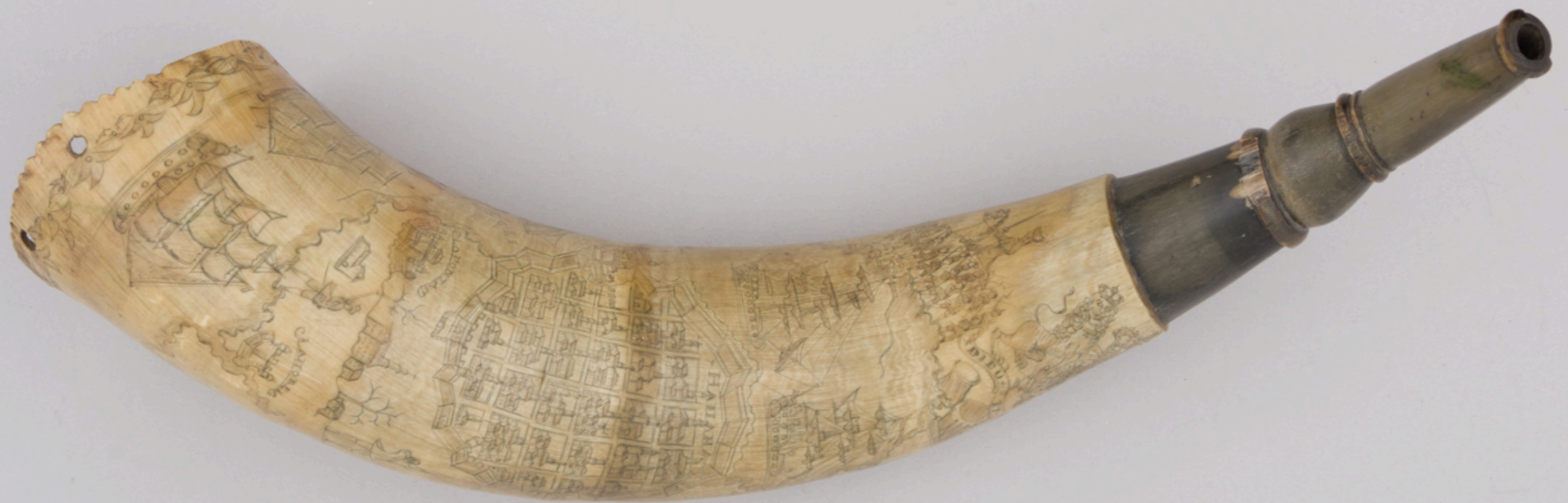
Powder Horn Engraved with a View of Havana, Cuba, Captured by British Forces in 1762. c. 1765 (Metropolitan Museum of Art)