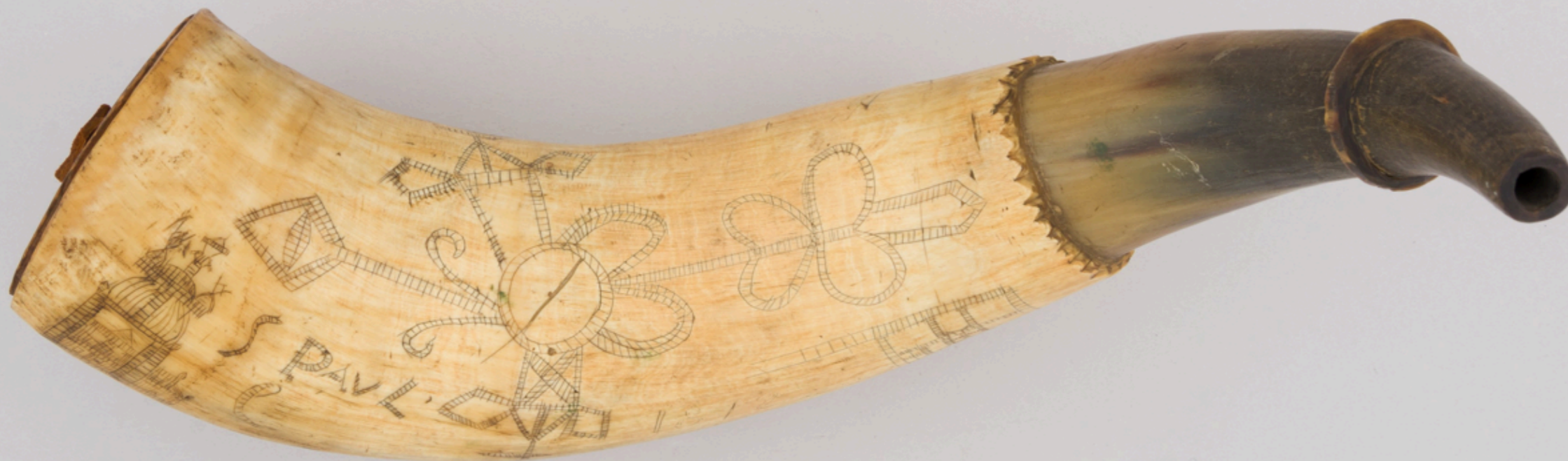
Powder Horn with Views of Saint Paul's Church and Fort Solom 1760 (Metropolitan Museum of Art)