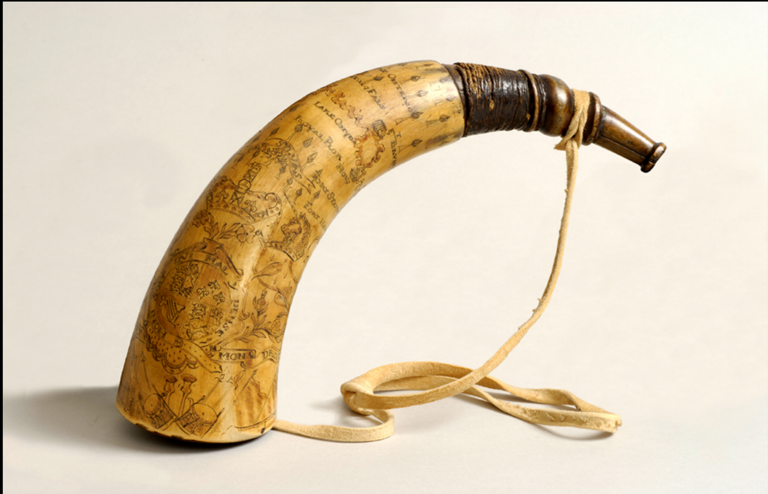
Powder Horn c. 1760 (Illinois State Museum)