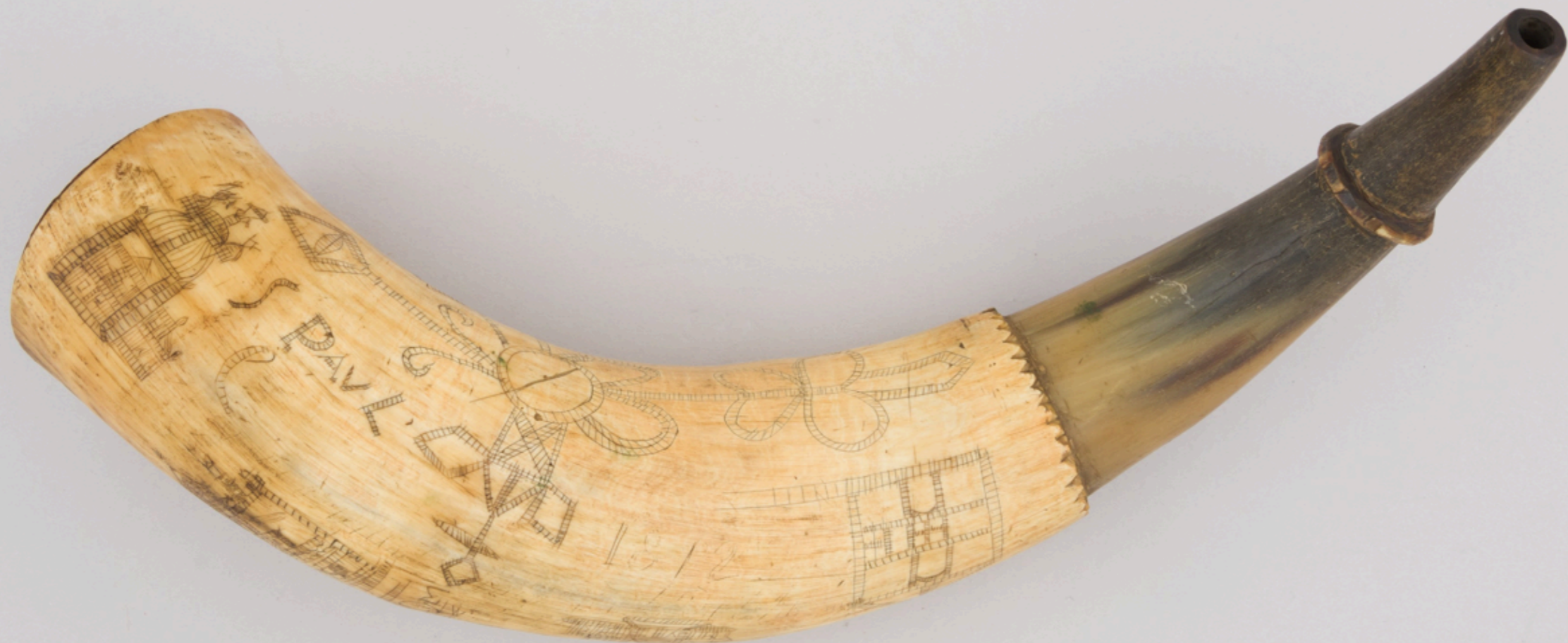
Powder Horn with Views of Saint Paul's Church and Fort Solom 1760 (Metropolitan Museum of Art)