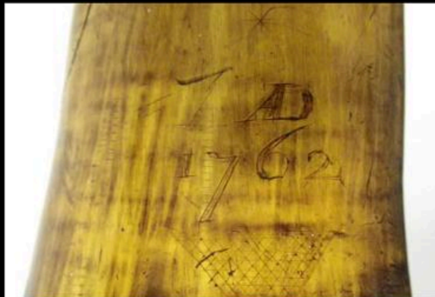
Powder Horn of Amos Chaffee of Woodstock, Connecticut April 8, 1762 (Fort Ticonderoga)