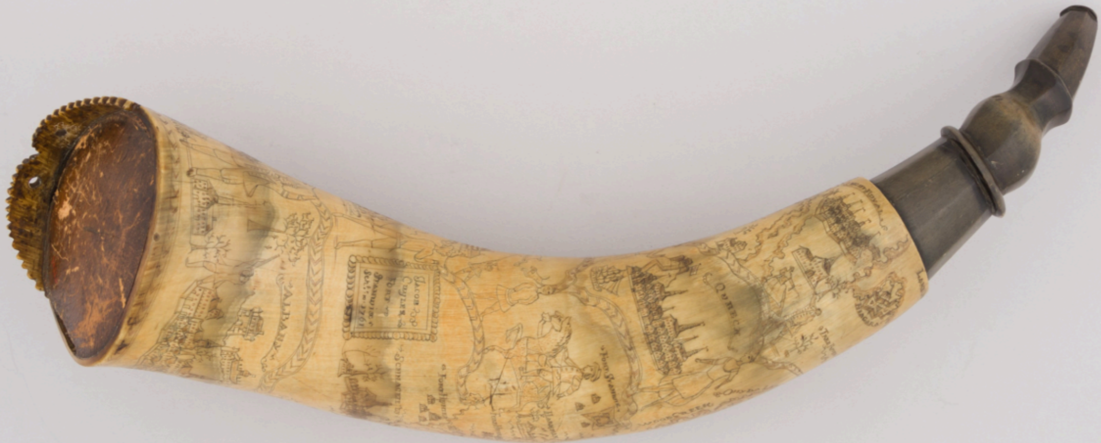
Powder Horn Depicting Rome, New York, and Fort Stanwix 1761 (Metropolitan Museum of Art)