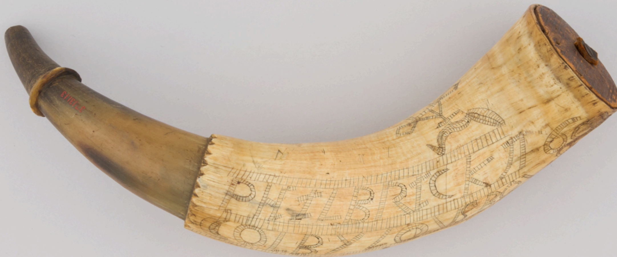
Powder Horn with Views of Saint Paul's Church and Fort Solom 1760 (Metropolitan Museum of Art)