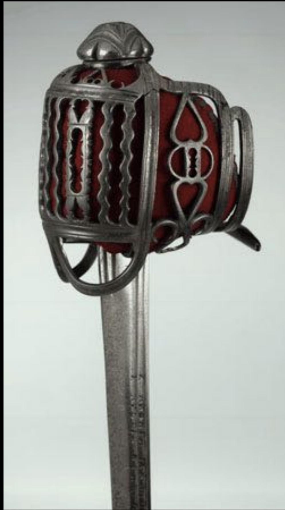
Scottish Basket Hilted Backsword Mid 18th Century (National Museums of Scotland)