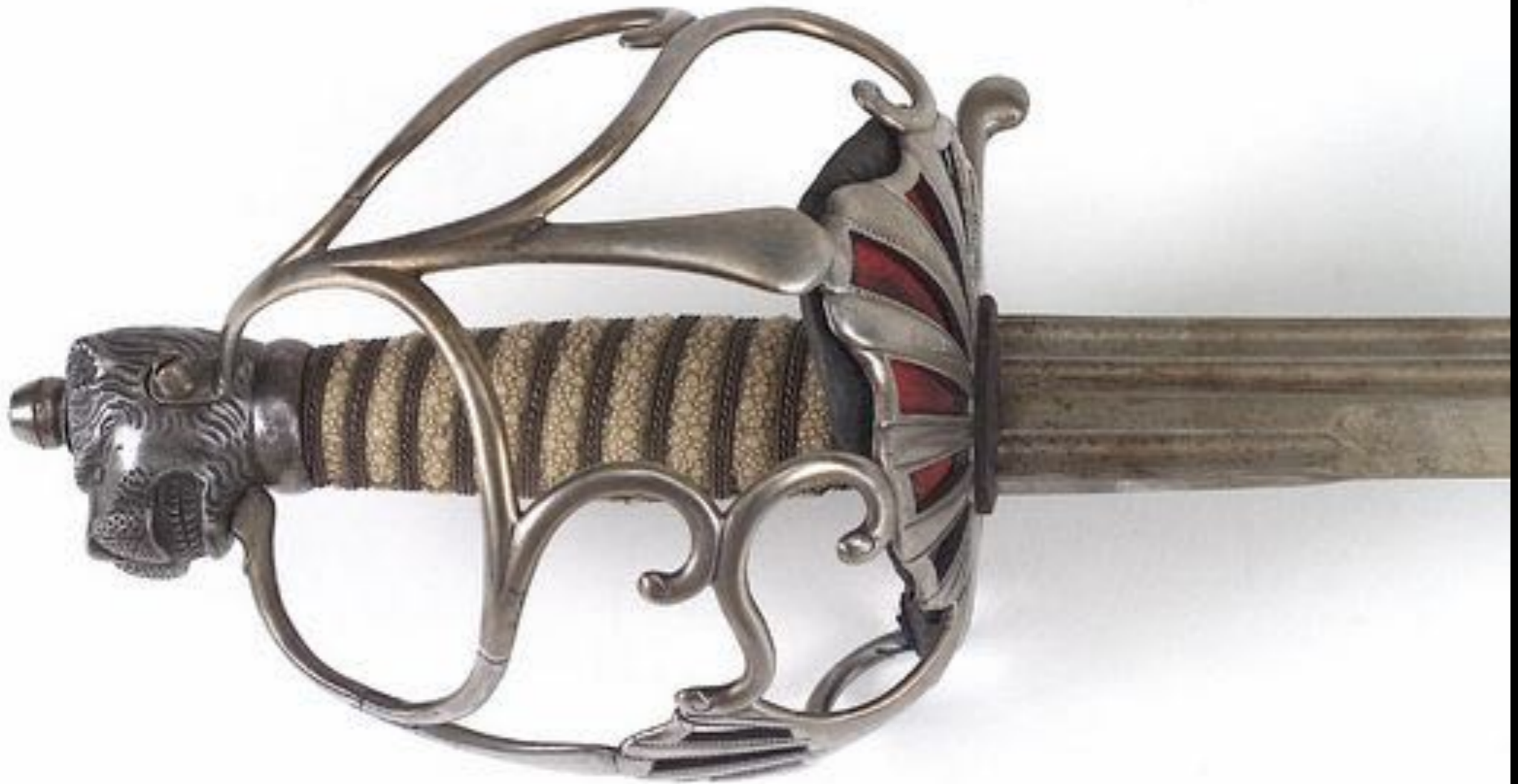
English Iron Hilted Backsword with Lion Head Pommel Mid 18th Century (National Maritime Museum, Greenwich, London)