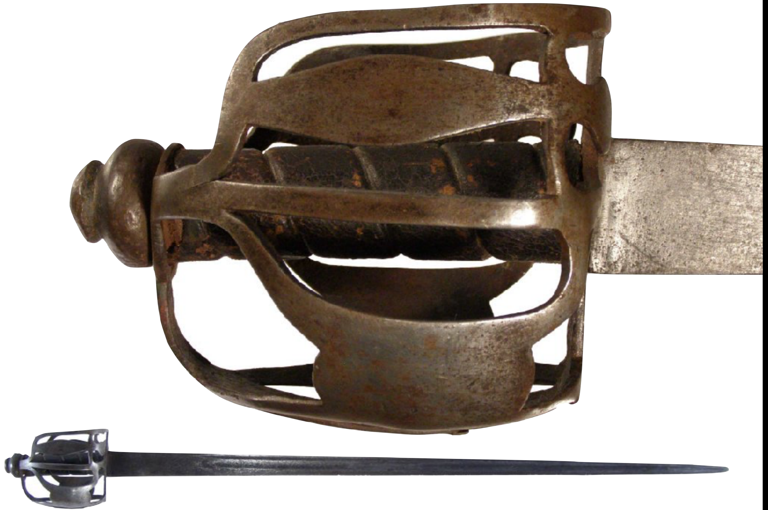
English Basket Hilted Cavalry Backsword