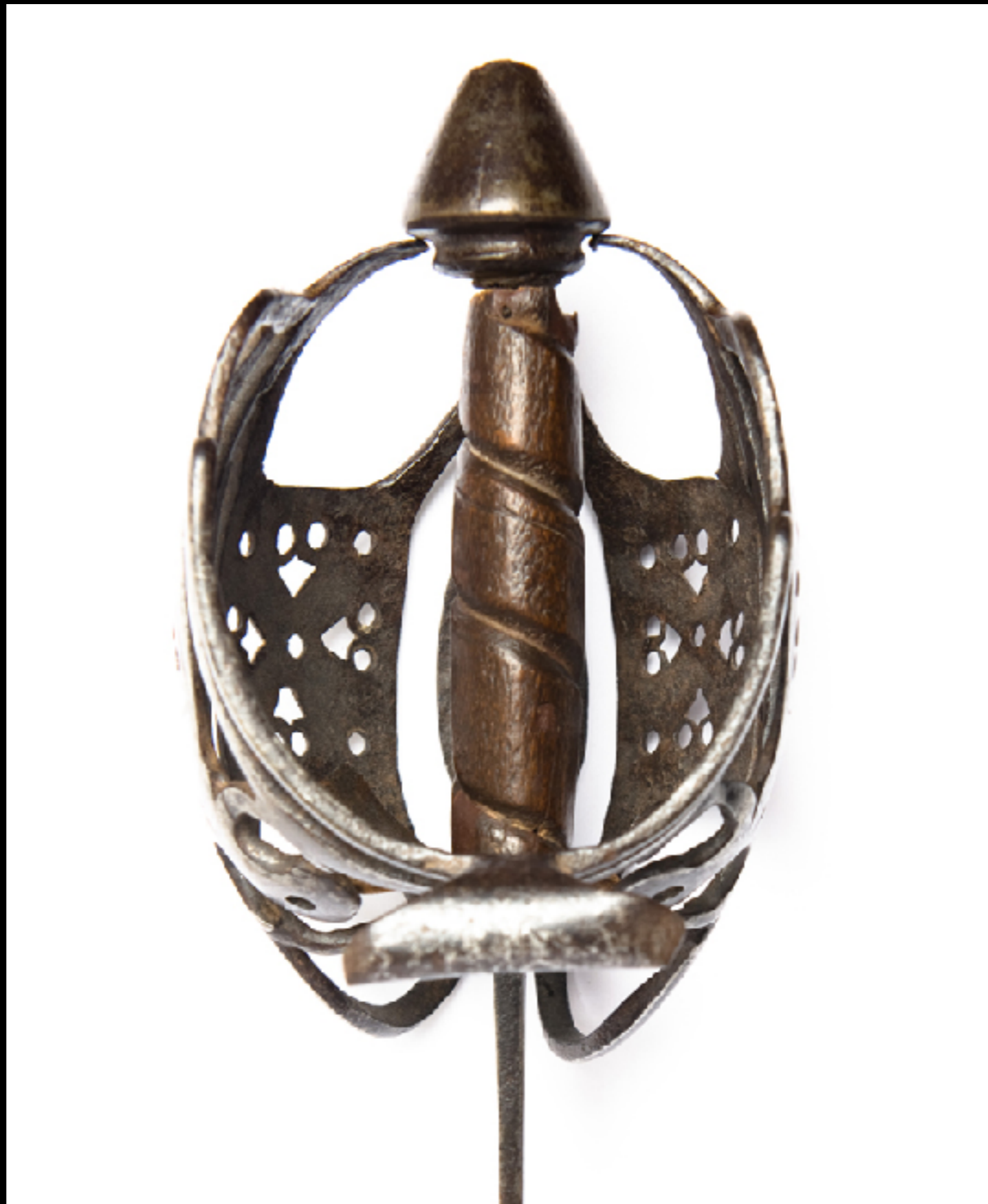
English Basket Hilted Backsword by Drury, Drury & Son Swordcutters & Goldsmiths (The Charleston Museum)