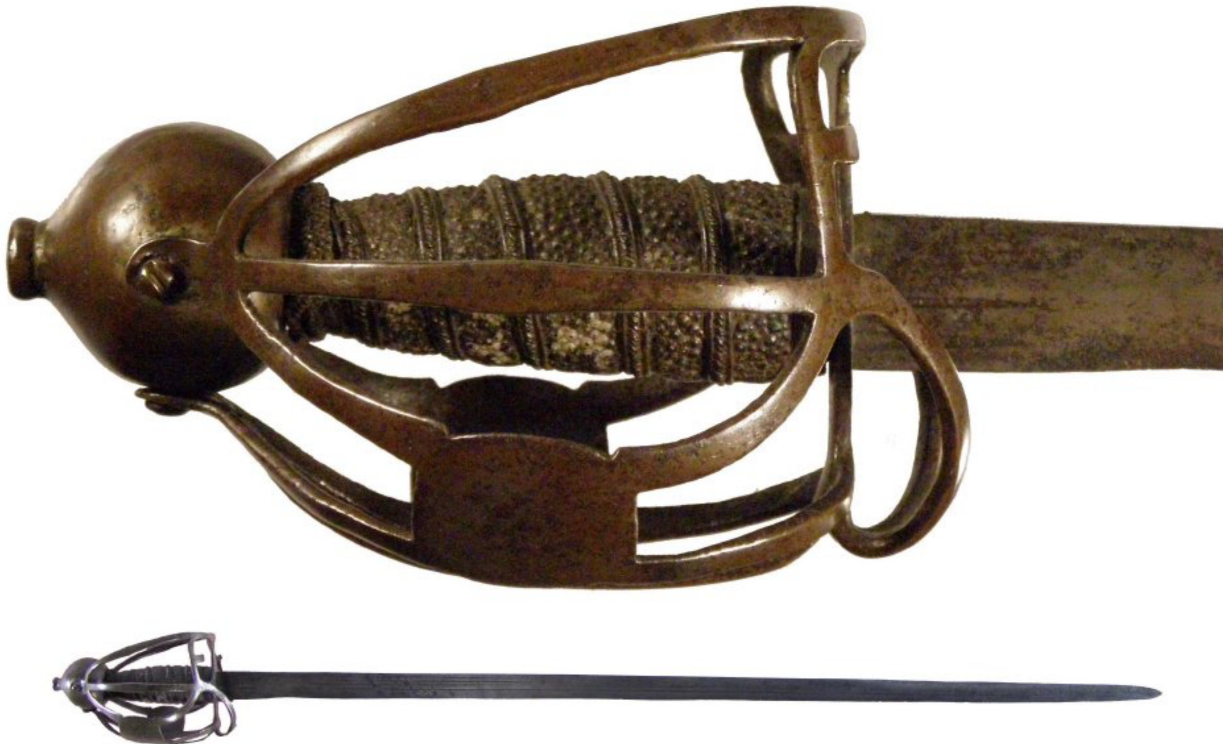
English Iron Basket Hilted Backsword