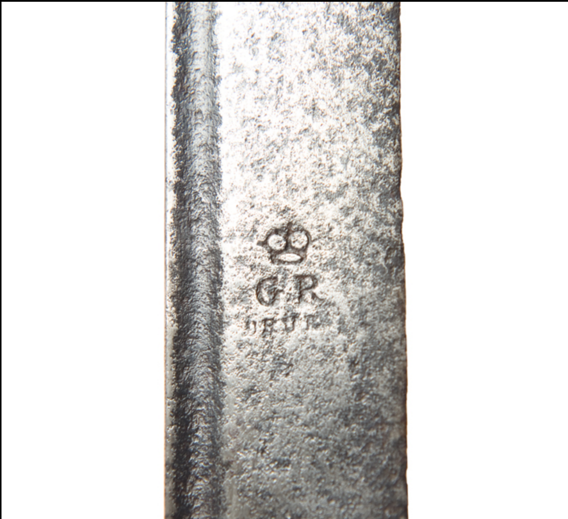
English Basket Hilted Backsword by Drury, Drury & Son Swordcutters & Goldsmiths (The Charleston Museum)