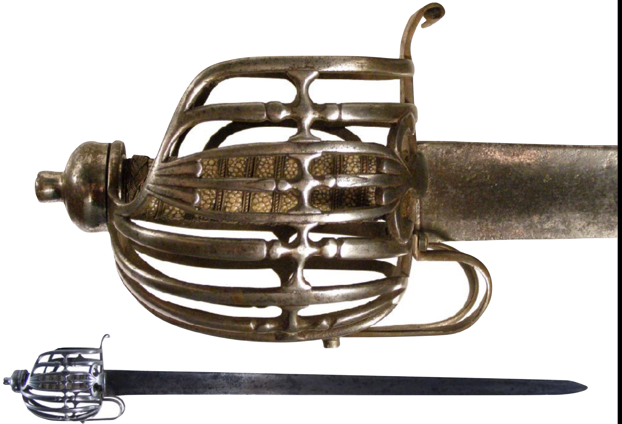
English Basket Hilted Horseman's Backsword