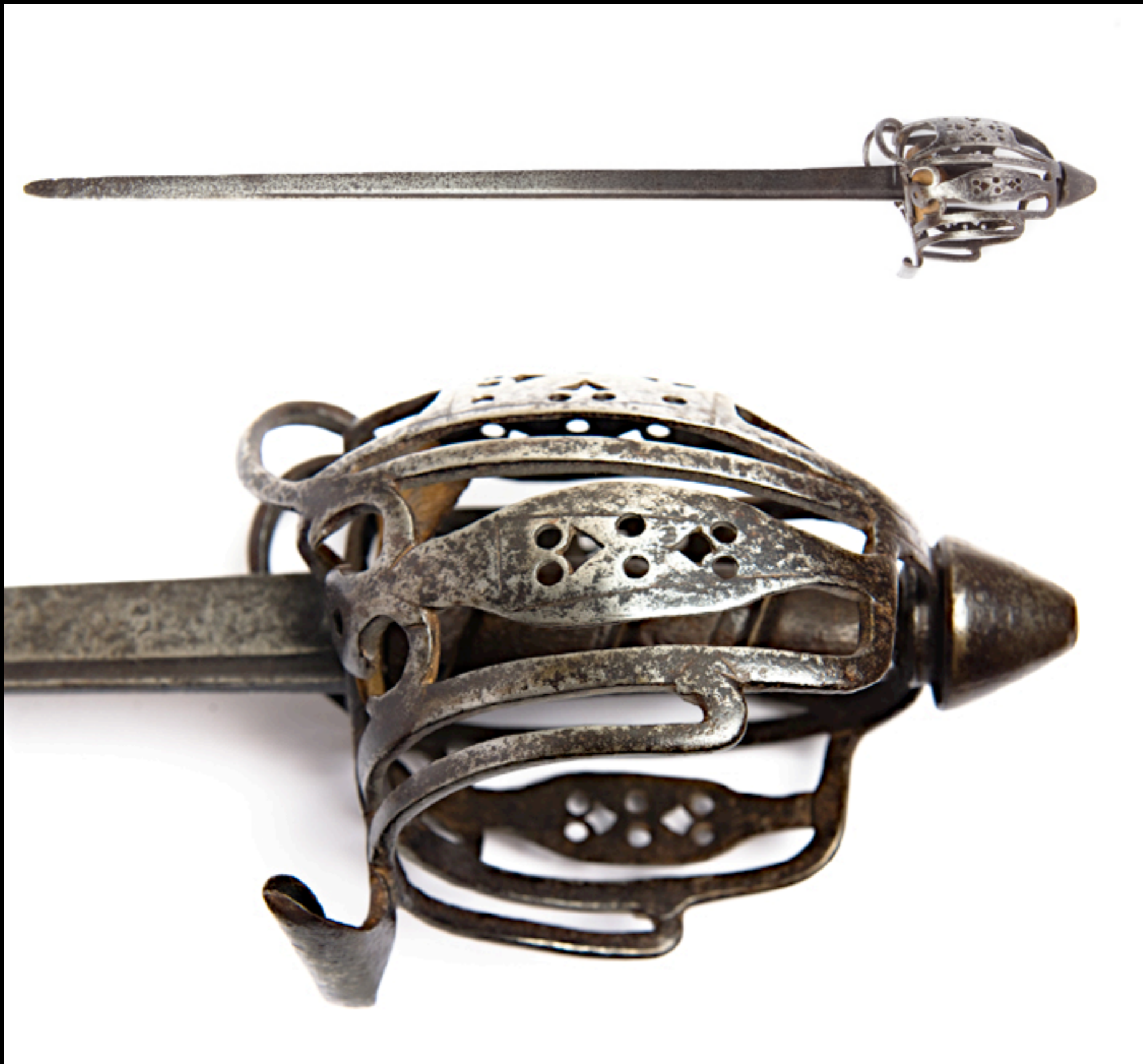
English Basket Hilted Backsword by Drury, Drury & Son Swordcutters & Goldsmiths (The Charleston Museum)