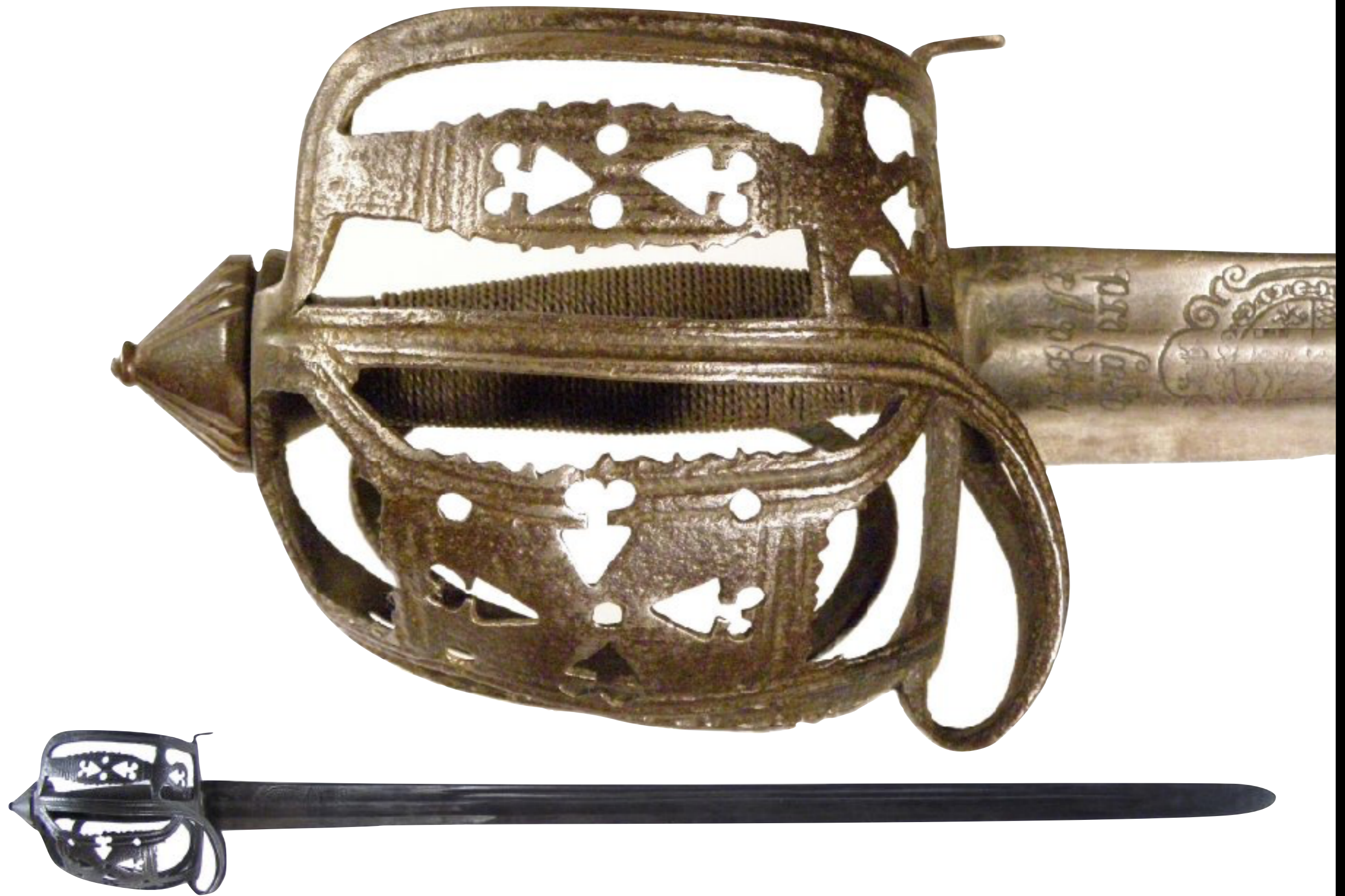
English Basket Hilted Horseman's Backsword