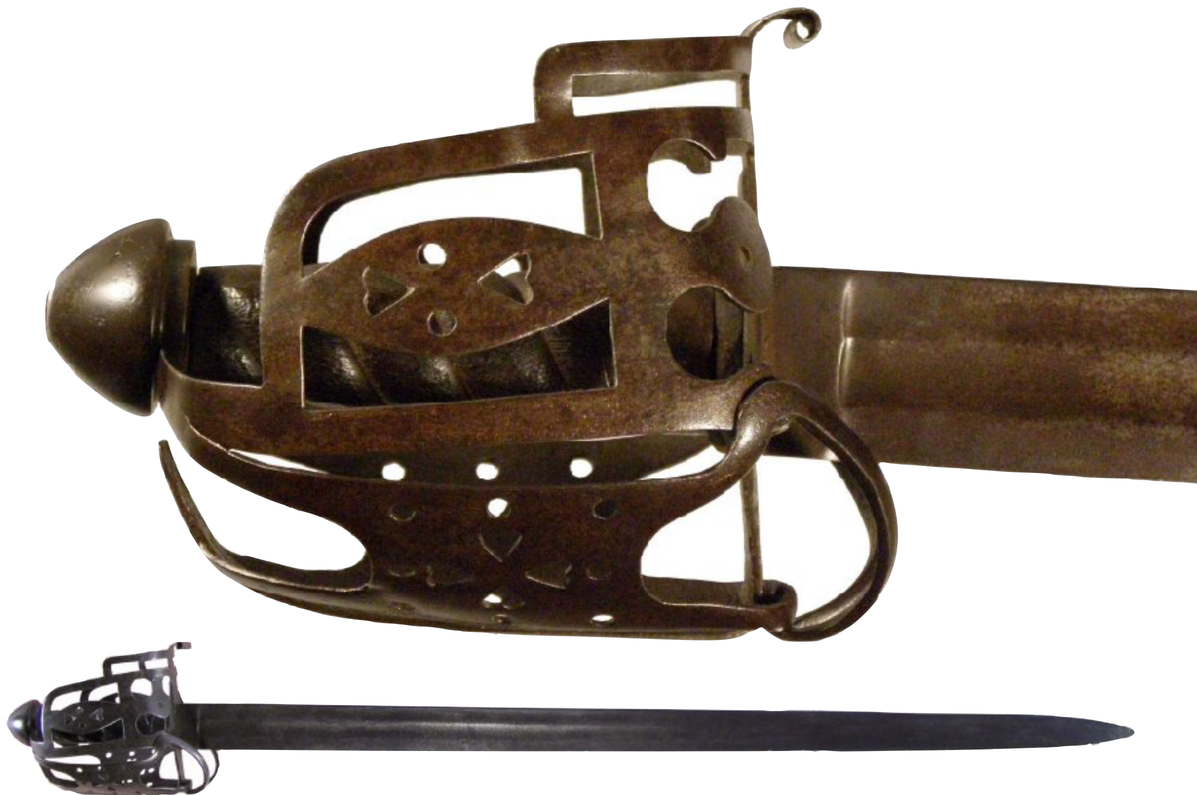
Scottish Basket Hilted Cavalry Backsword