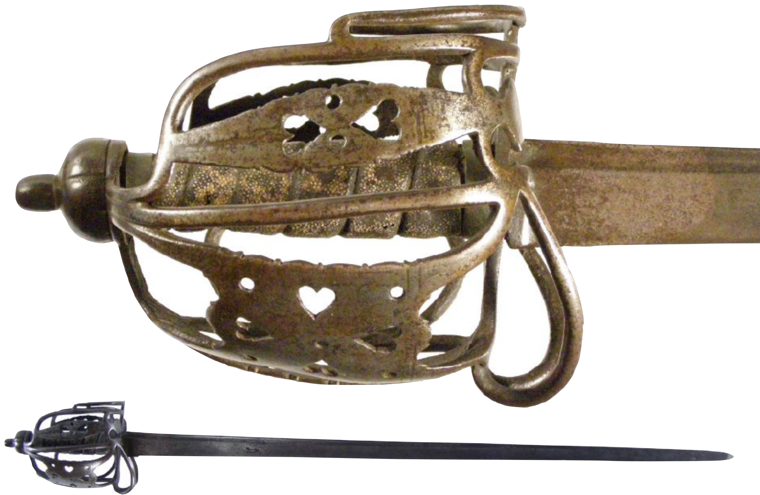
English Basket Hilted Cavalry Backsword