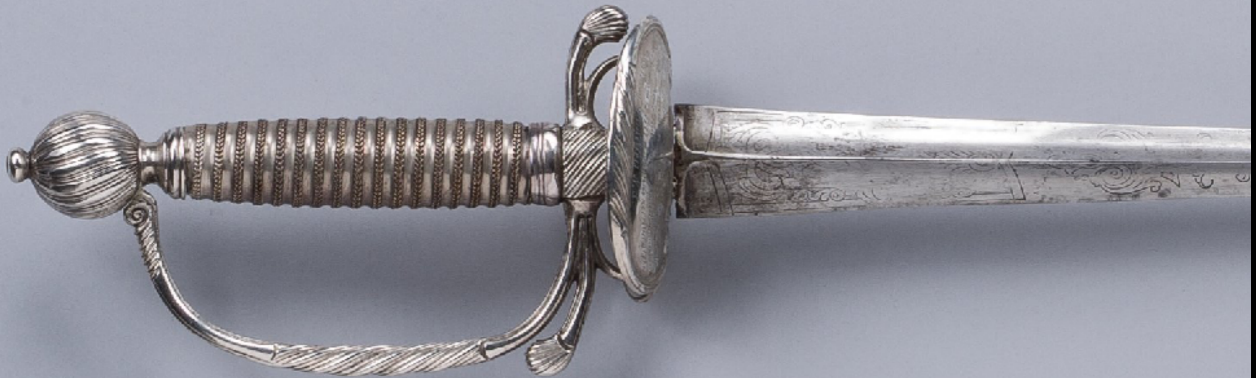
English or American Silver Hilted Small Sword Owned by General Hugh Mercer Late 18th Century (Museum of the American Revolution)