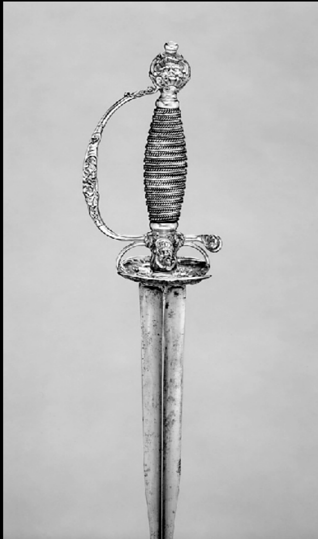
English Silver Hilted Small Sword Hallmarked 1747 - 1748 (Metropolitan Museum of Art)