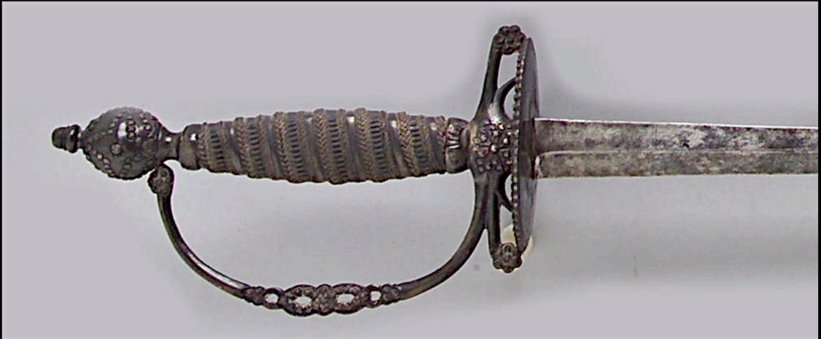
English Silver Hilted Small Sword c. Late 18th Century