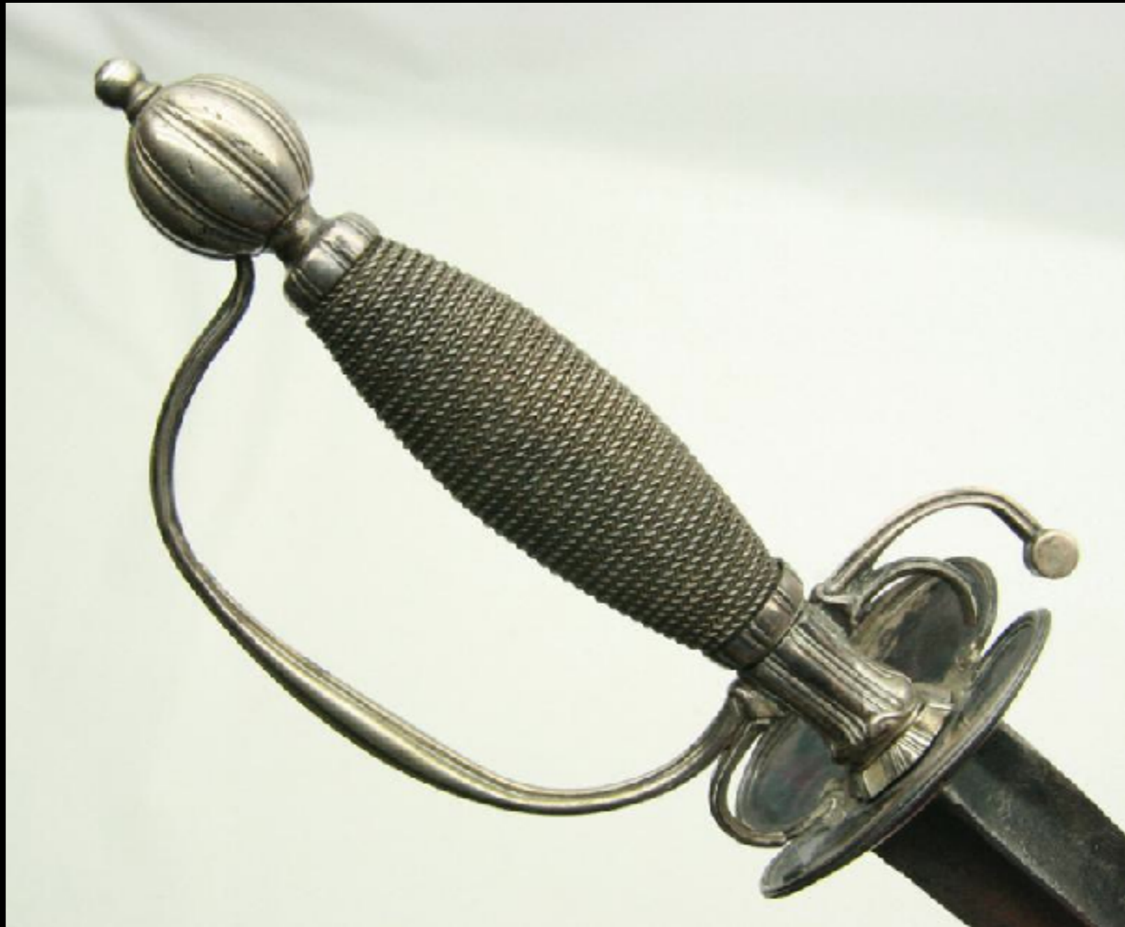
American or English Silver Hilted Small Sword