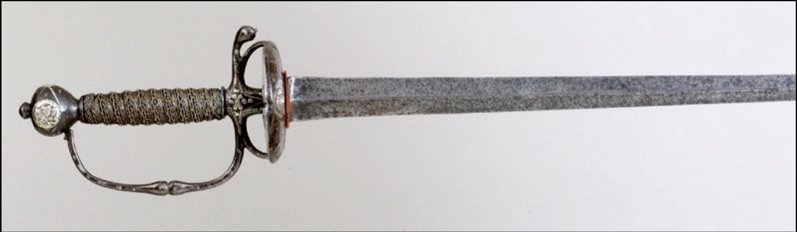
European Silver Hilted Small Sword 18th Century (Estate of Tom Wnuck of Rochester, New York)