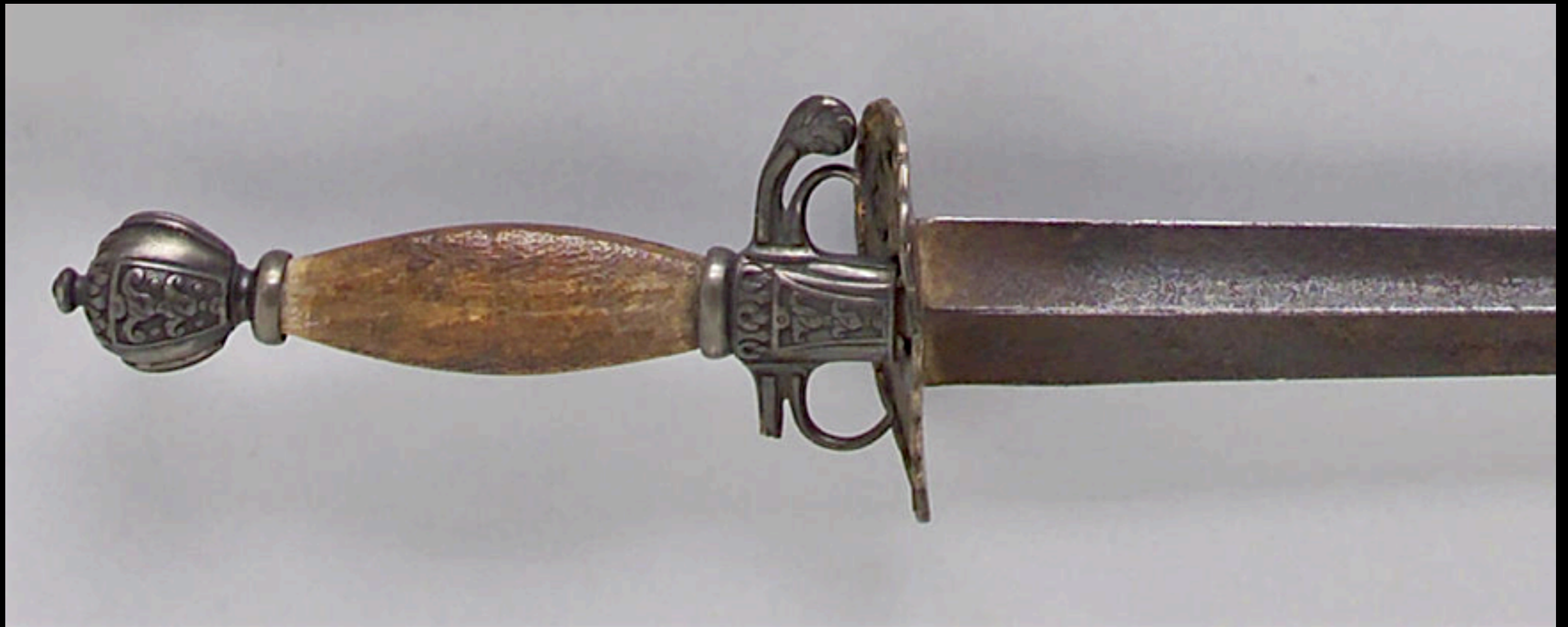
Continental Silver Hilted Small Sword Engraved "JP / Liberty or Death" c. 2nd Half 18th Century