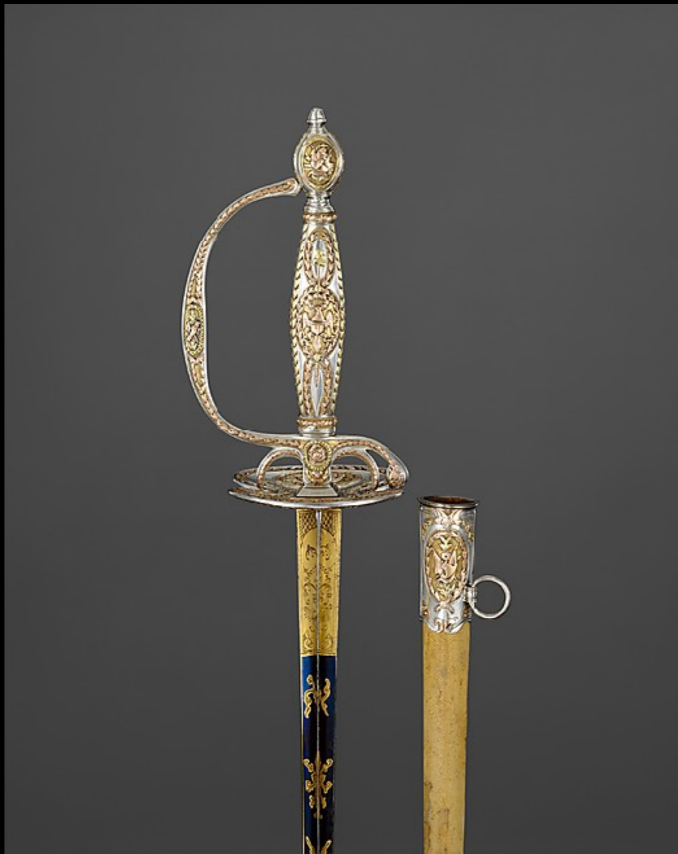
French Manufacture Small Sword of Colonel Marinus Willett Awarded by the Continental Congress in 1785 or 1786 (Metropolitan Museum of Art)