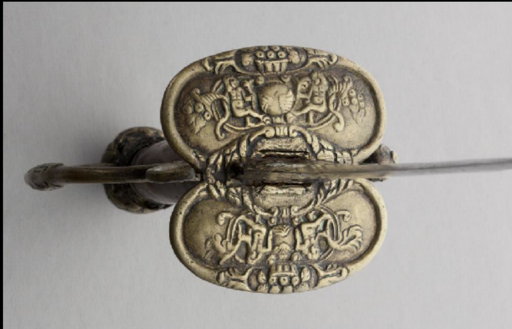
English Infantry "Smallsword" Hanger c. 1720 - 1750