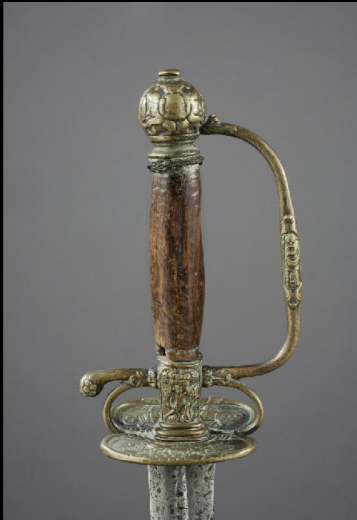
English Infantry "Smallsword" Hanger c. 1720 - 1750