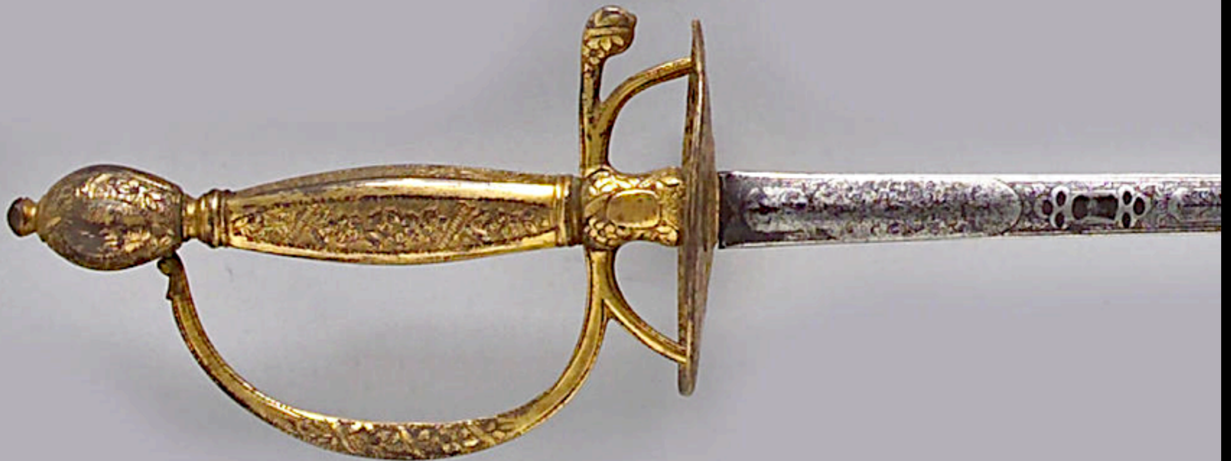
European Small Sword 18th Century (Bonhams - William H. Guthman Collection)