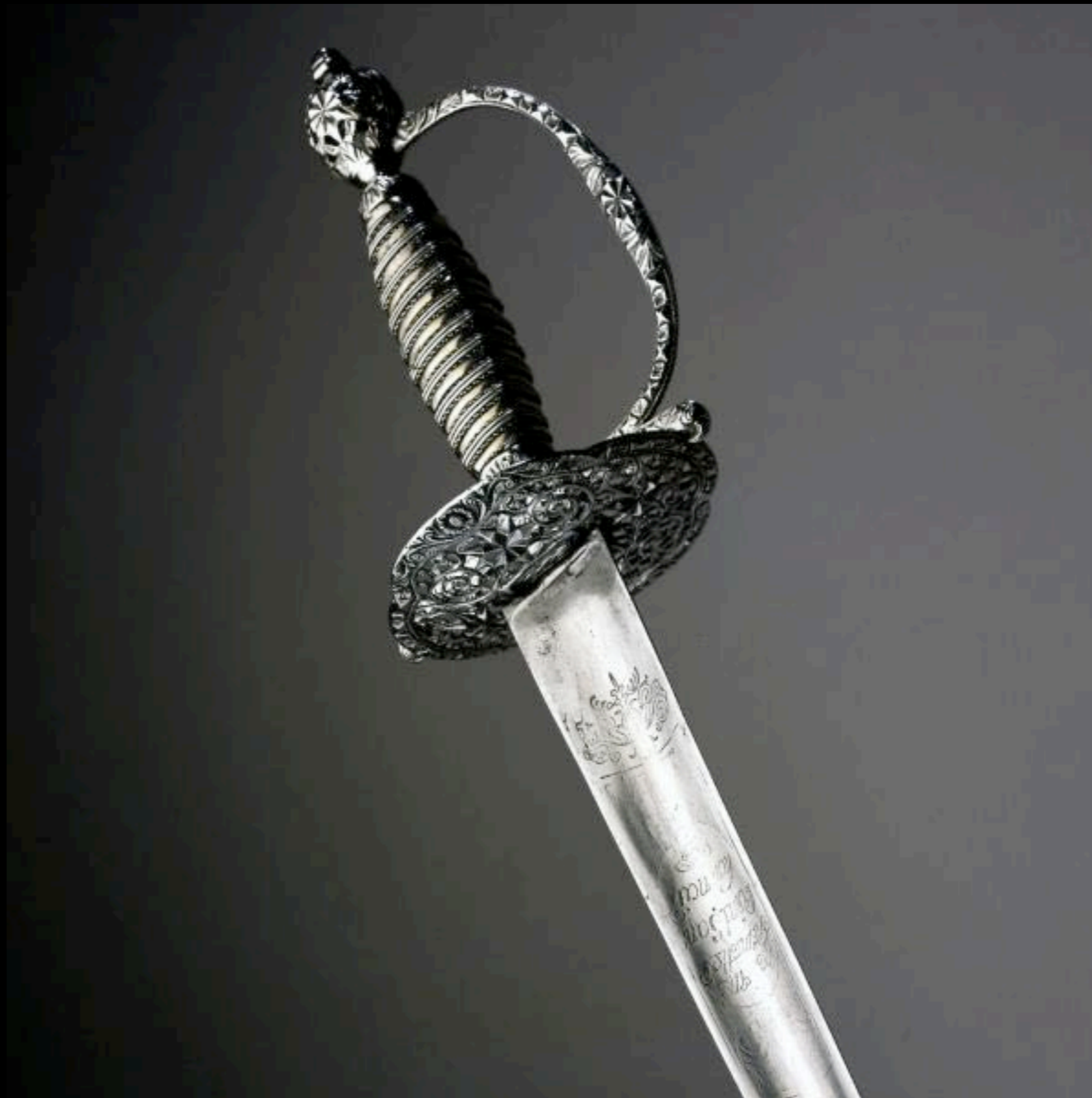
Court Sword Worn by Benjamin Franklin While in France c. 1775 (The Franklin Institute, Philadelphia, Pennsylvania)