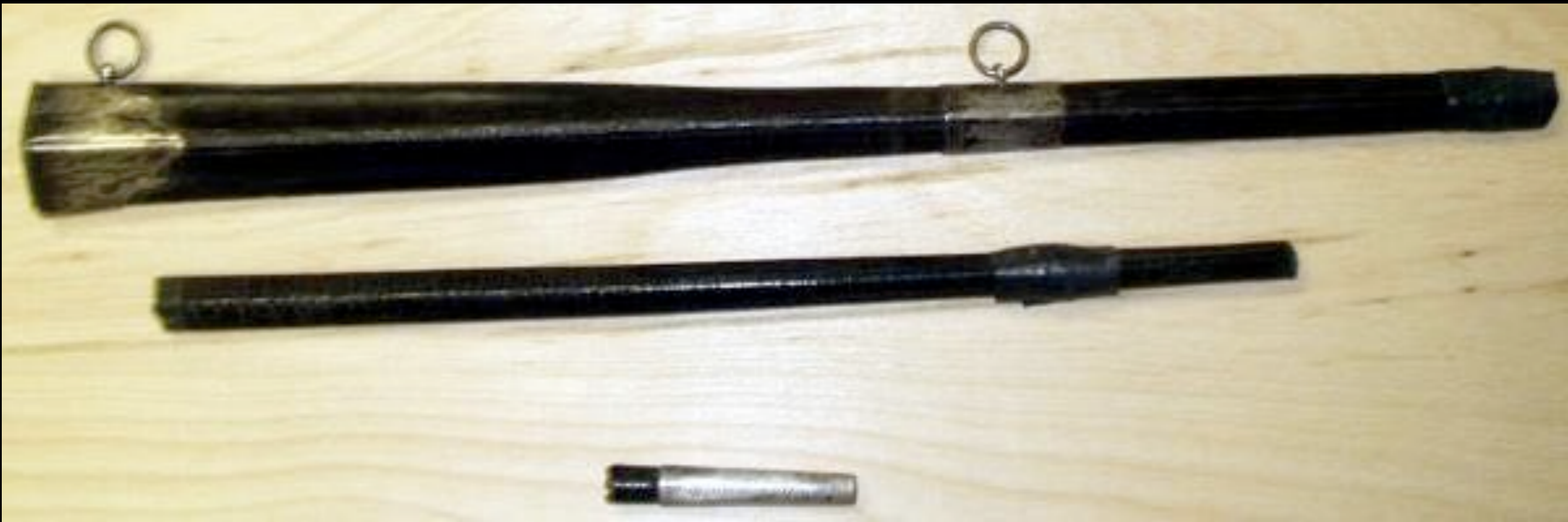
Court Sword Worn by Benjamin Franklin While in France c. 1775 (The Franklin Institute, Philadelphia, Pennsylvania)