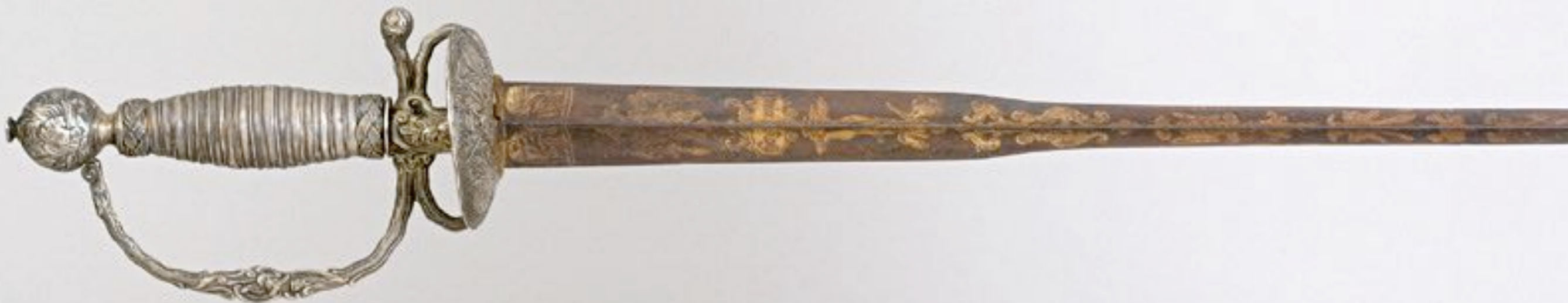
European Silver Hilted Small Sword 18th Century (Estate of Tom Wnuck of Rochester, New York)