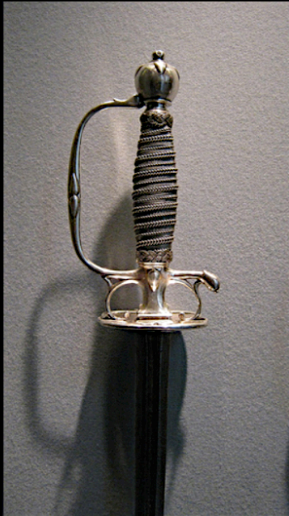
American Silver-Hilted Small Sword by William Little of Newburyport, Massachusetts c. 1730