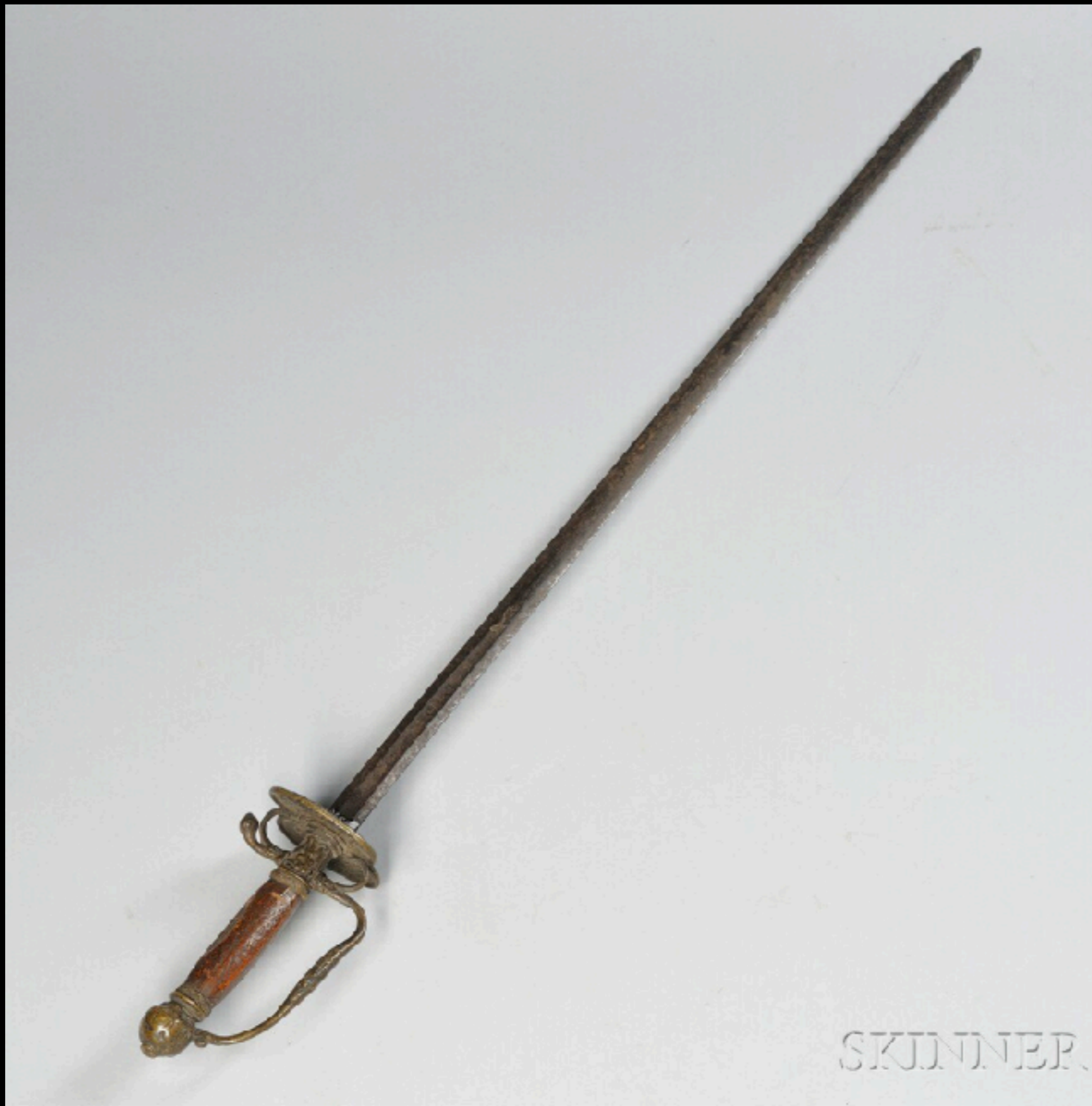
English Brass Hilted Small Sword Steel Blade Marked "BRIDGE" with a Running Fox c. 1700 - 1750