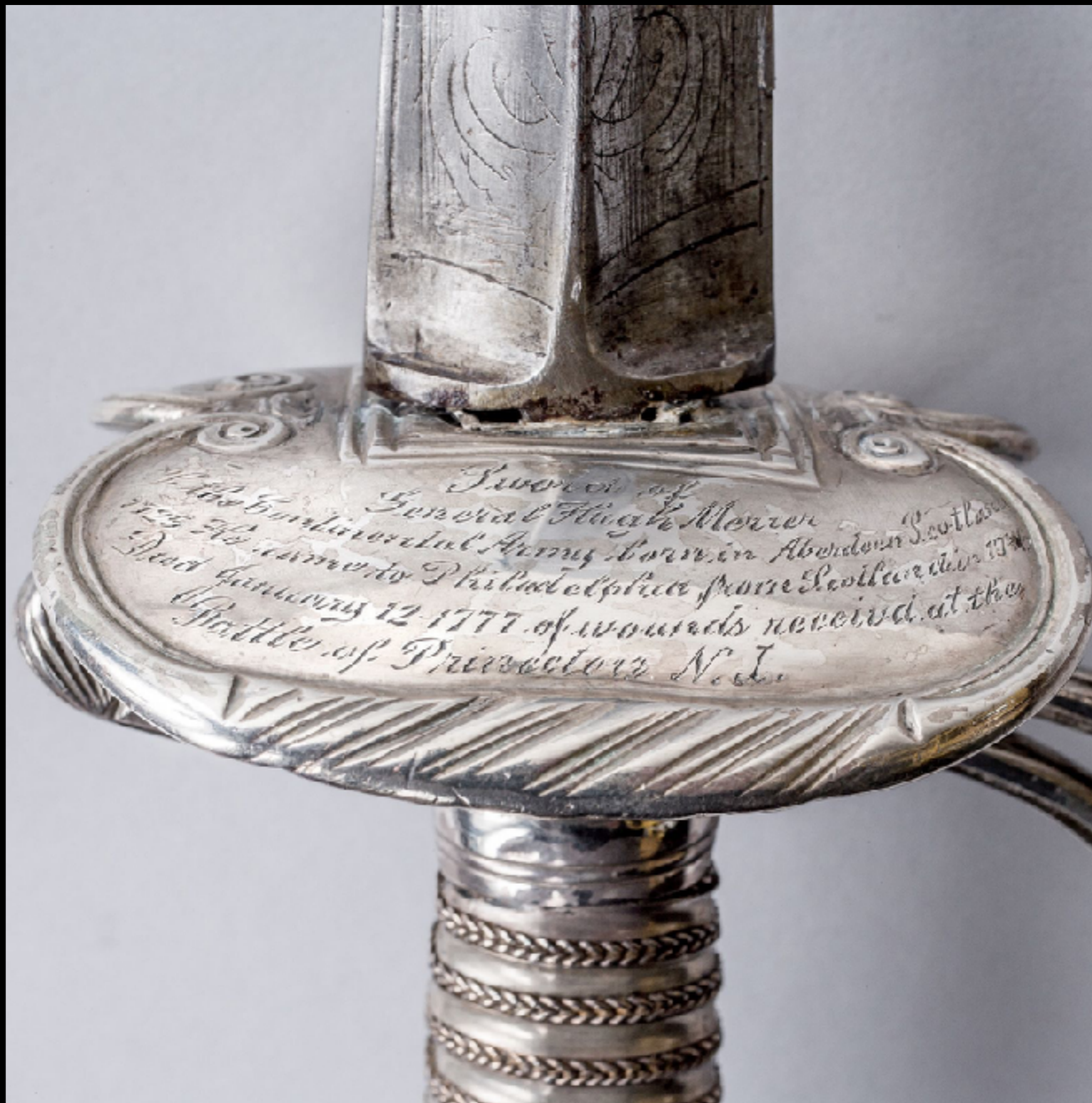
English or American Silver Hilted Small Sword Owned by General Hugh Mercer Late 18th Century (Museum of the American Revolution)