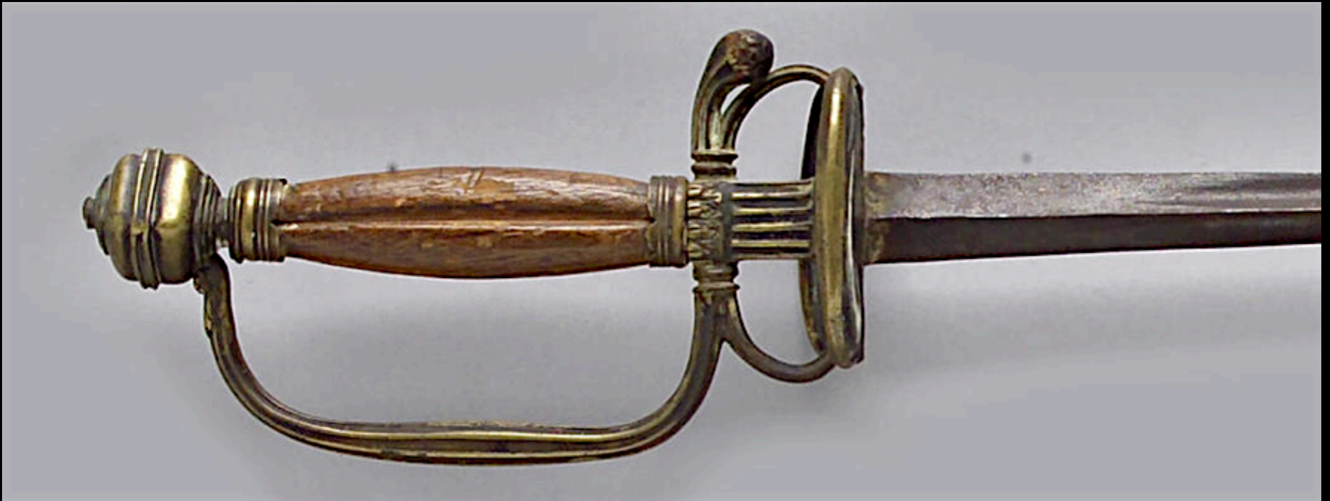
Continental Brass Hilted Small Sword 18th Century (Bonhams - William H. Guthman Collection)