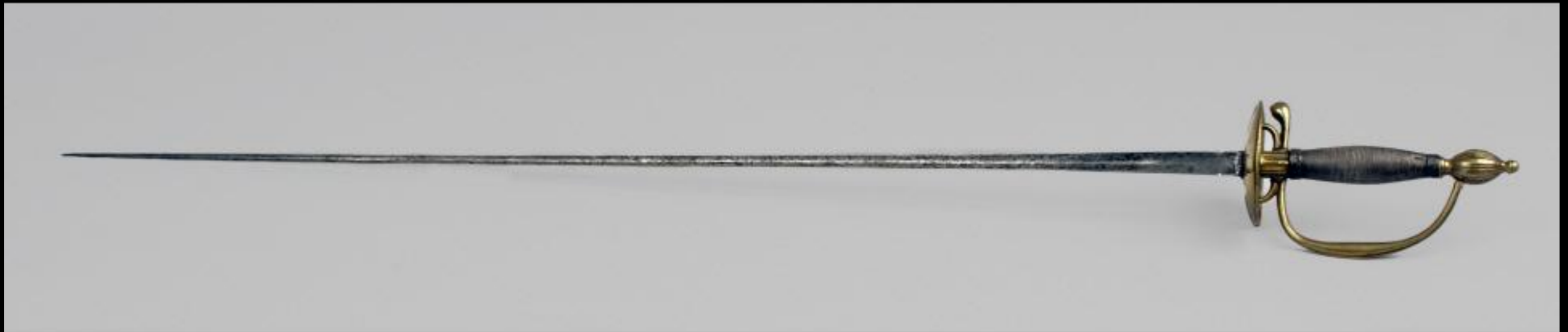
French "Model 1767" Officer's Small Sword c. 1767 - 1780 (Colonial Williamsburg Foundation)