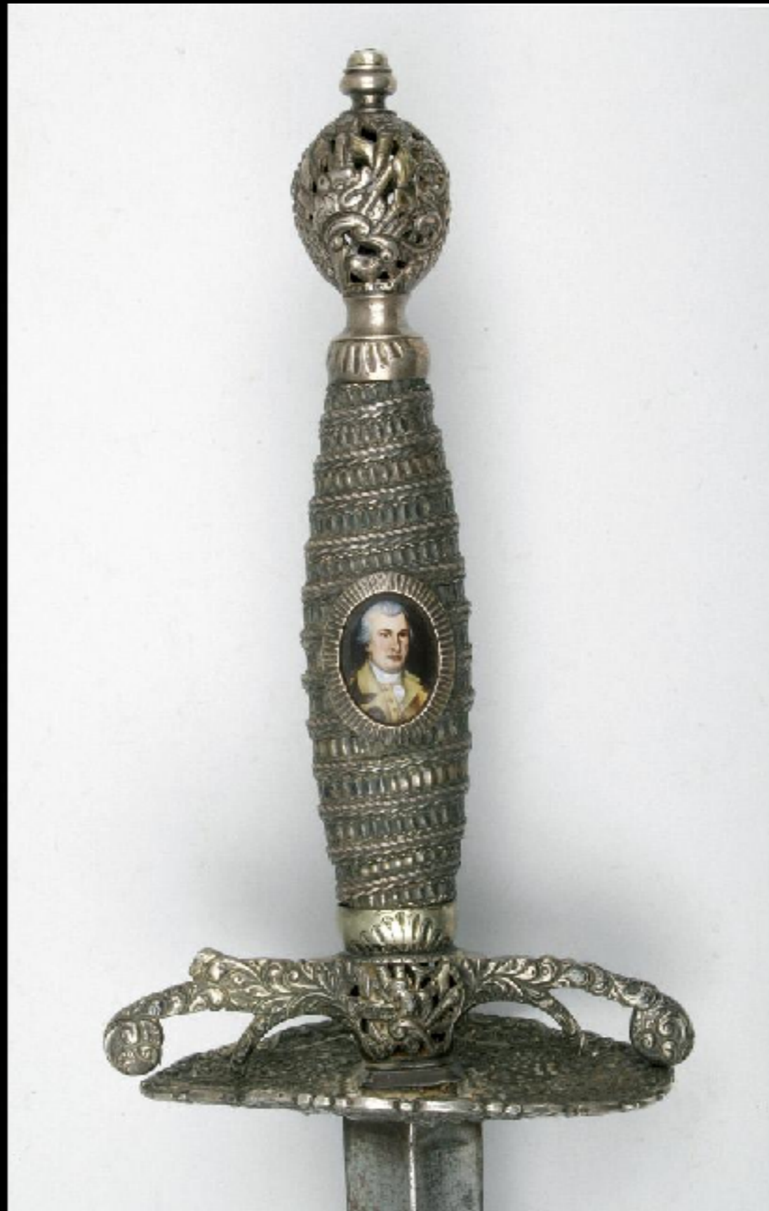
English Silver Hilted Small Sword Presented to Major General Nathaniel Greene in 1781 c. 1765 - 1770 (Colonial Williamsburg Foundation)