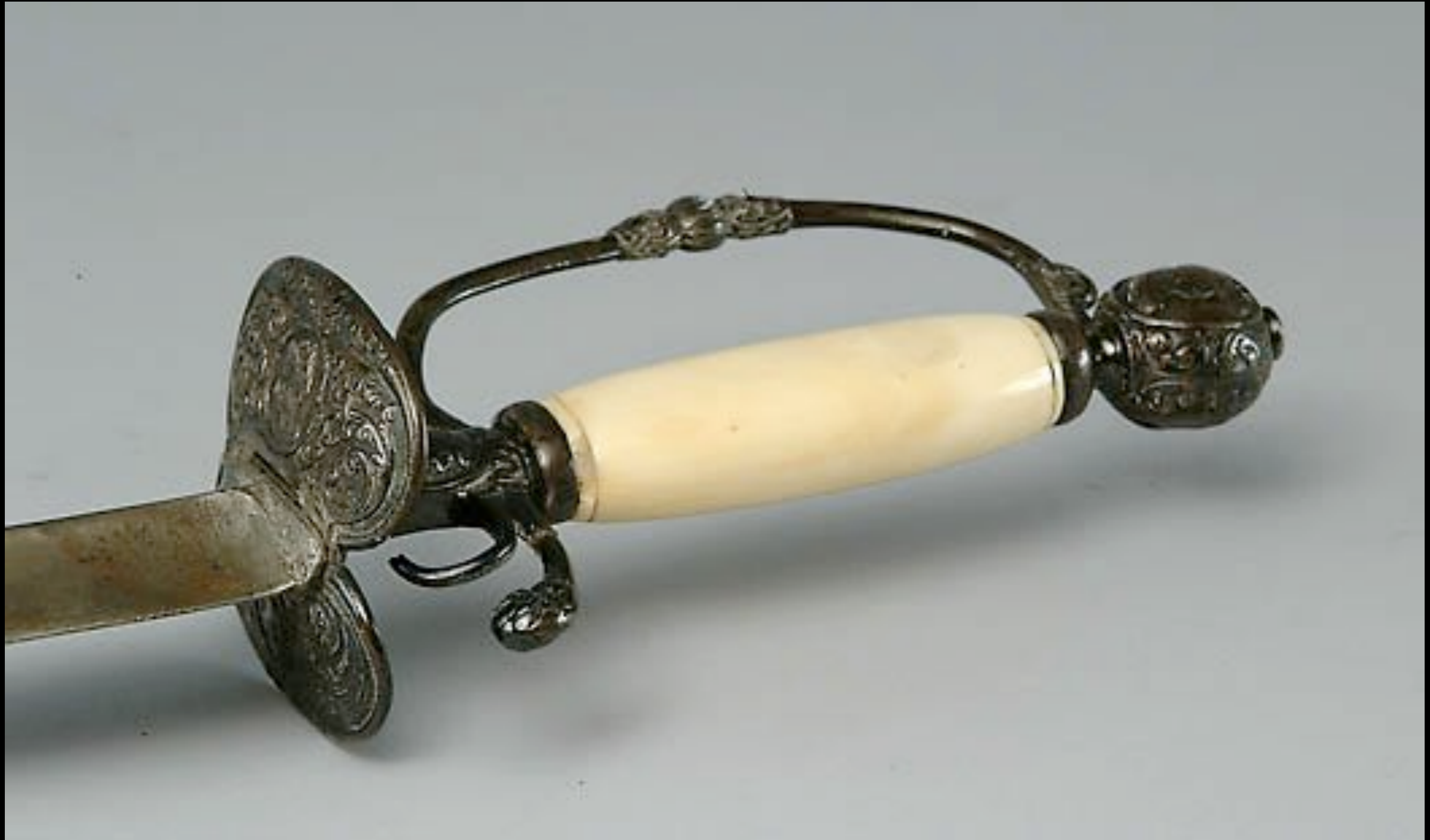
European Bone Grip Small Sword 18th Century (Private Collection)