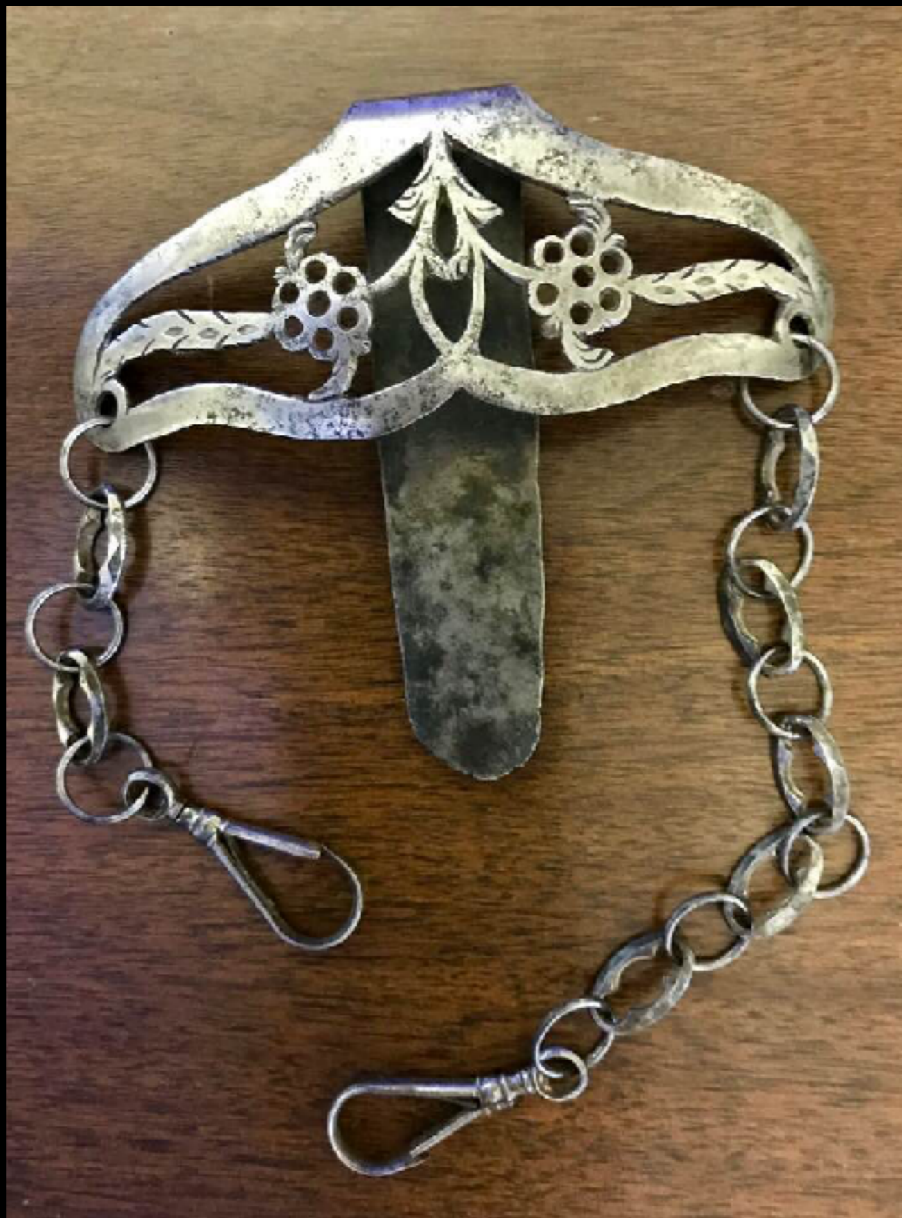
Cut Steel Sword Hanger Late 18th Century (G.S. Theberge Collection)