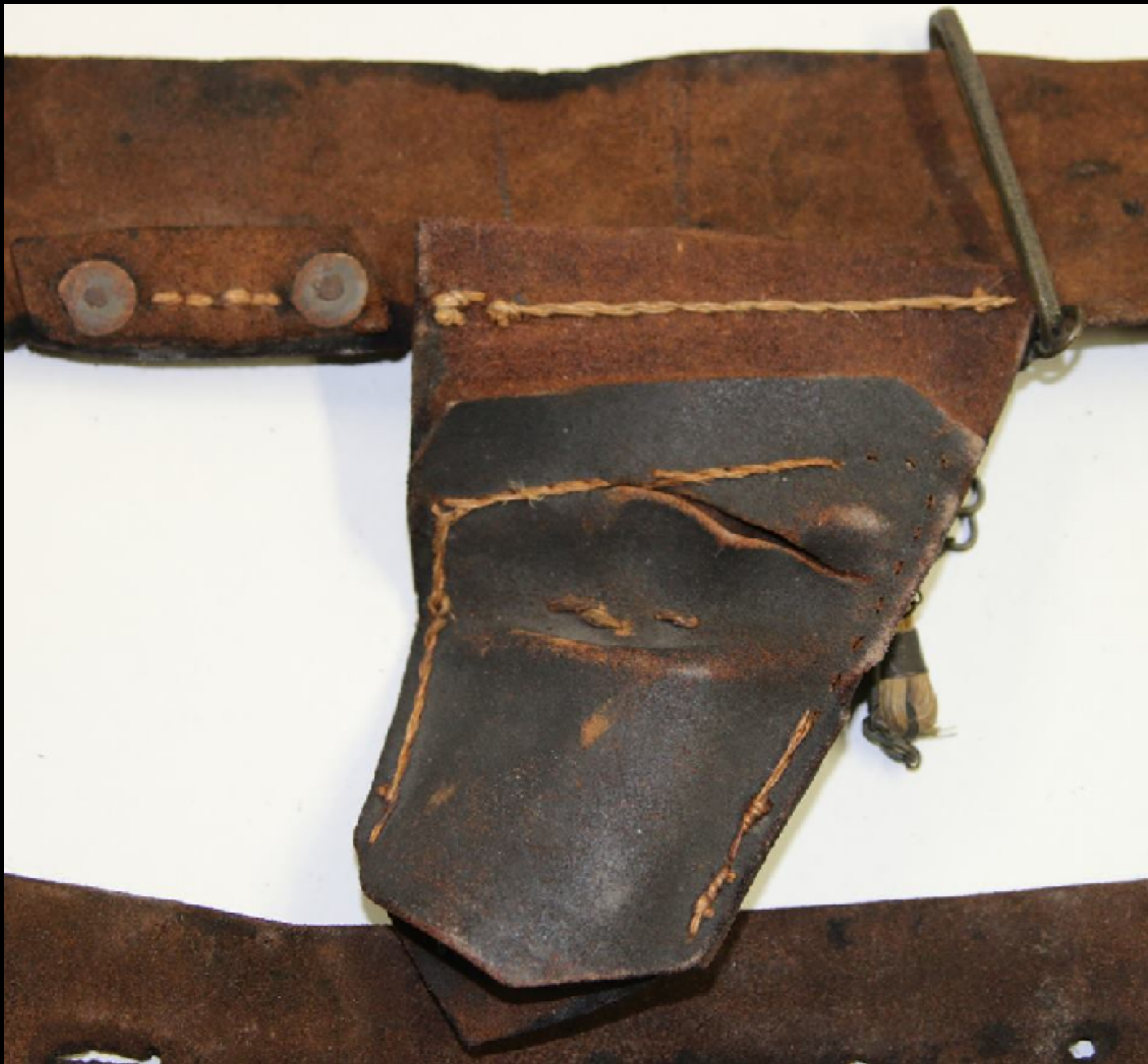
Recycled American or British Waistbelt Employing Iron Washers Typically Used by the British History of Bayonet Frog Removal and Addition of a Sword Frog (Don Troiani)