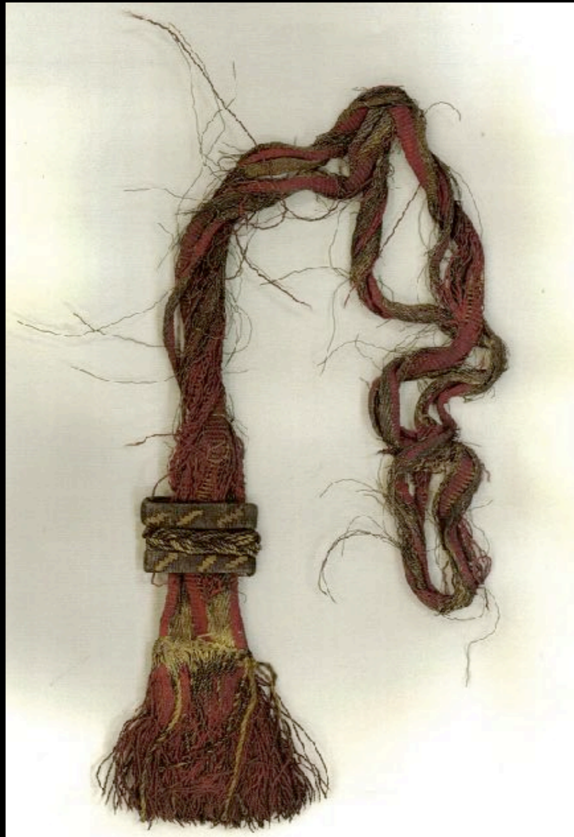
Sword Knot 18th Century (Private Collection)