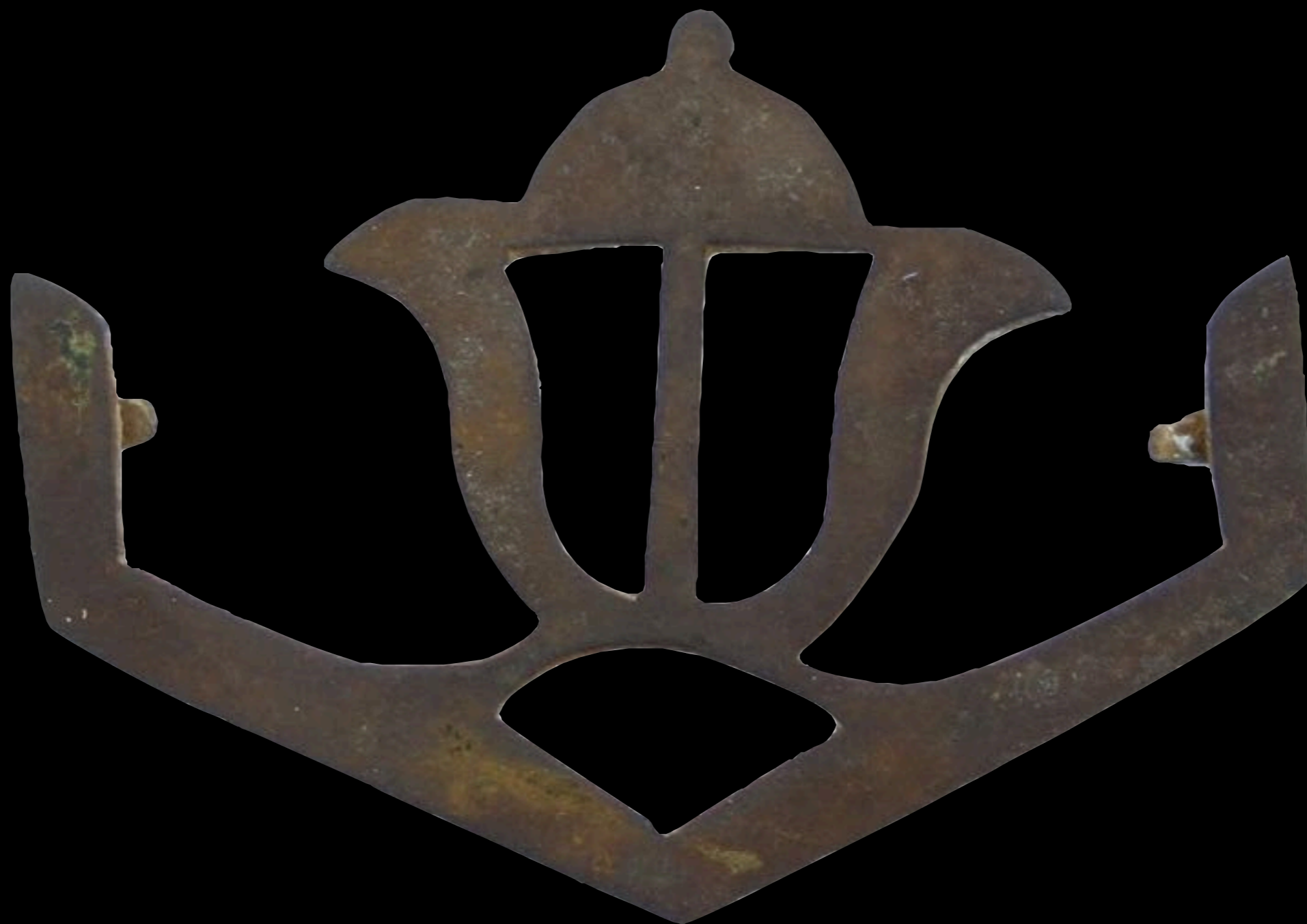
American "Liberty Cap" Belt Tip Excavated on Sites from 1779 - 1782