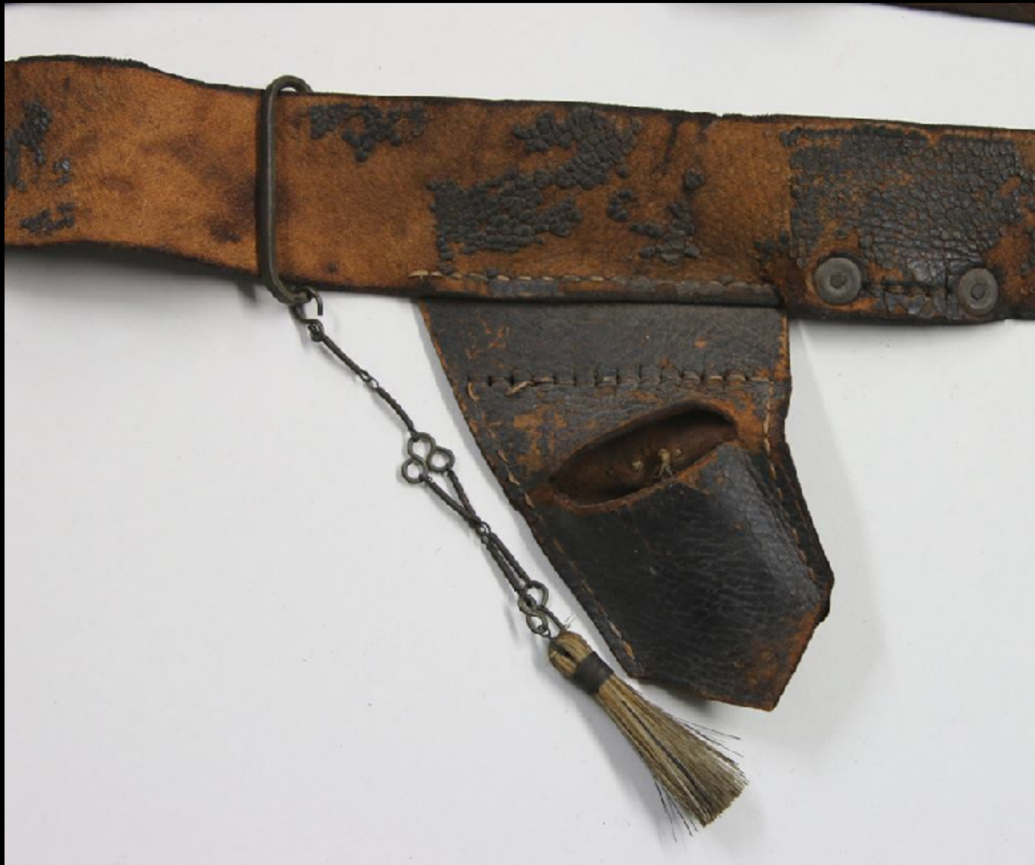
Recycled American or British Waistbelt Employing Iron Washers Typically Used by the British History of Bayonet Frog Removal and Addition of a Sword Frog (Don Troiani)