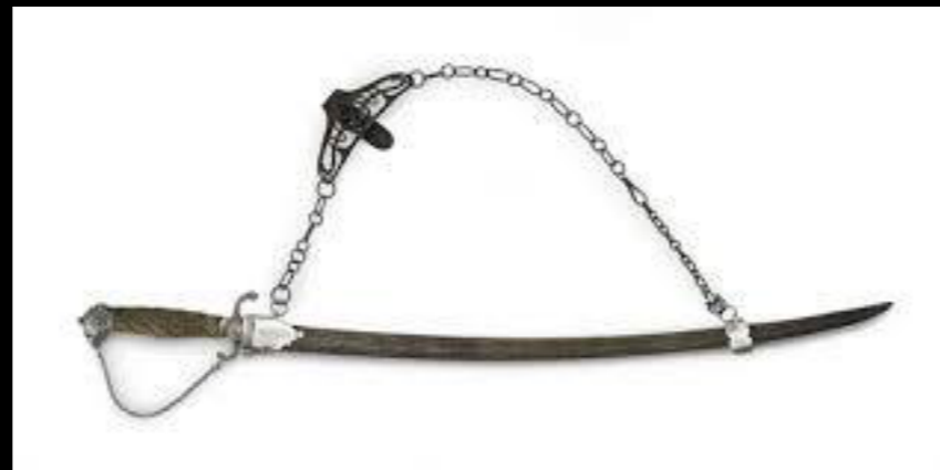
Cut Steel Sword Hangers 18th Century (Private Collection)