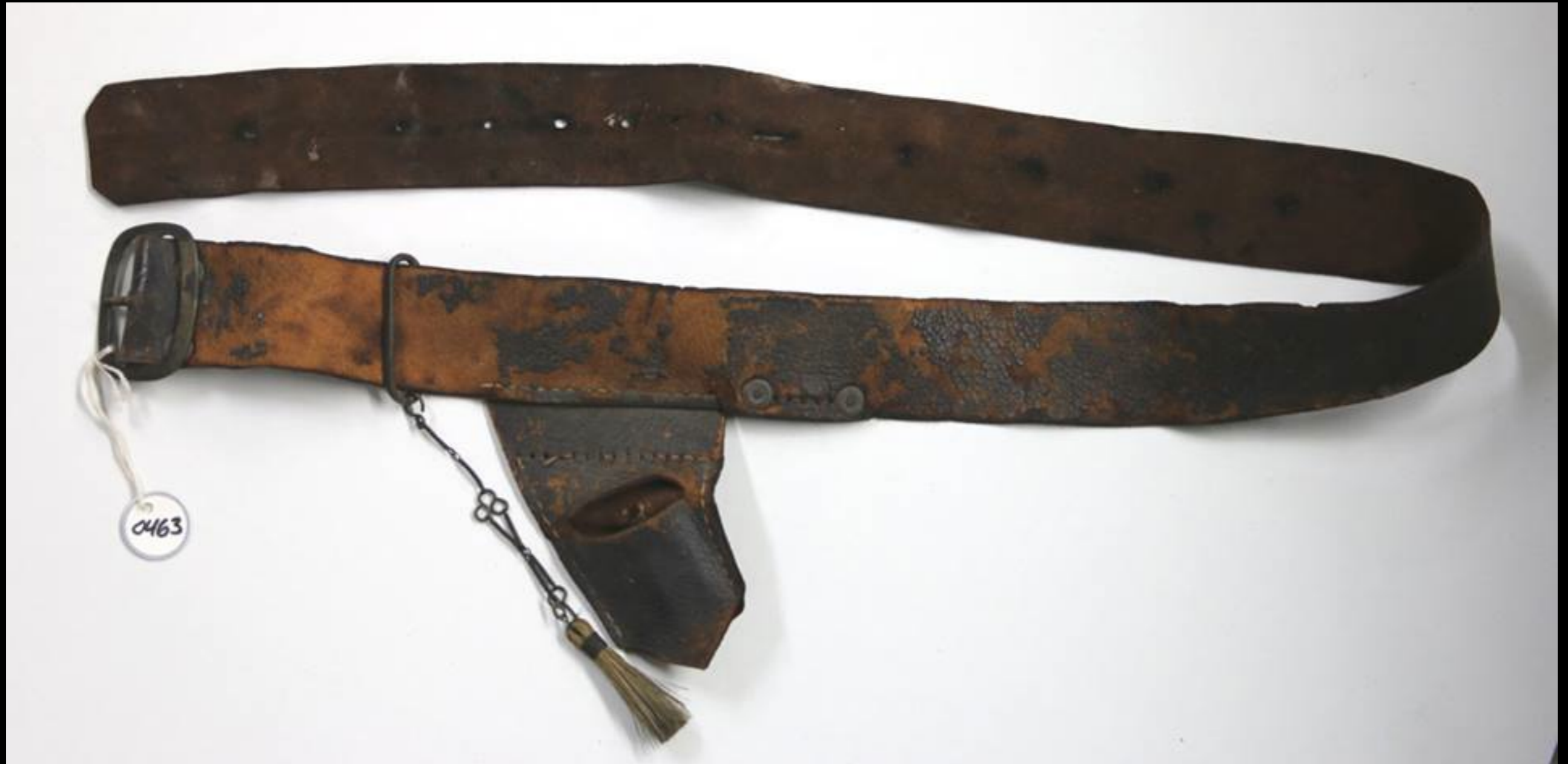
Recycled American or British Waistbelt Employing Iron Washers Typically Used by the British History of Bayonet Frog Removal and Addition of a Sword Frog (Don Troiani)