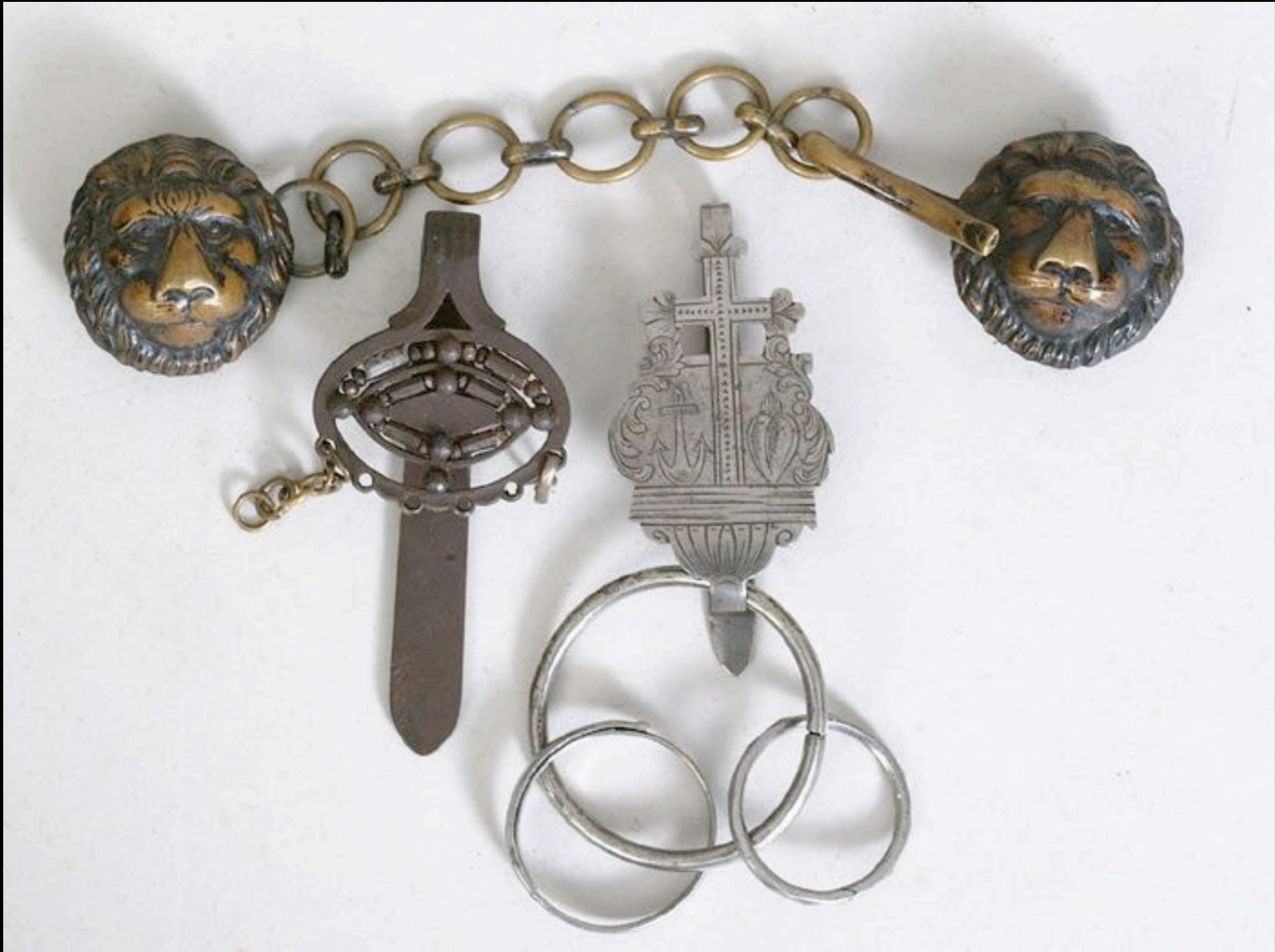
Cut Steel & Brass Sword Hangers Late 18th Century (Estate of Tom Wnuck)