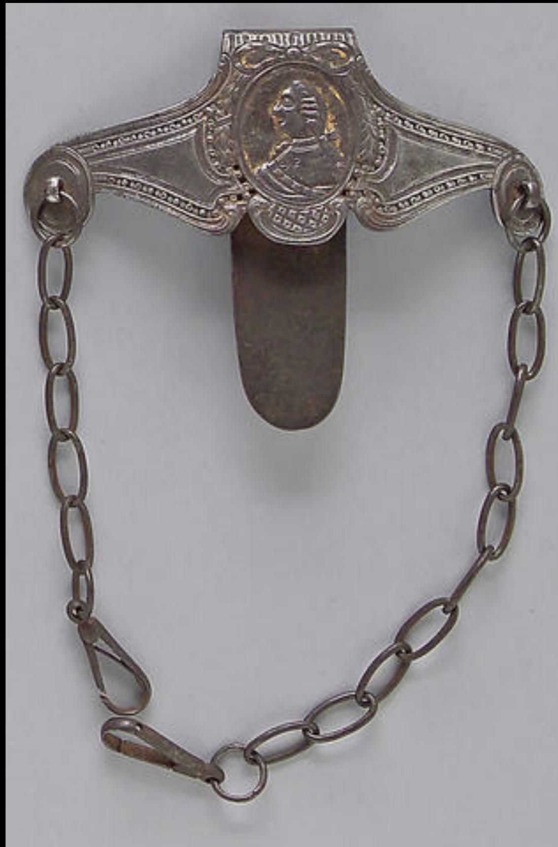
Cut Steel Sword Hanger Late 18th Century