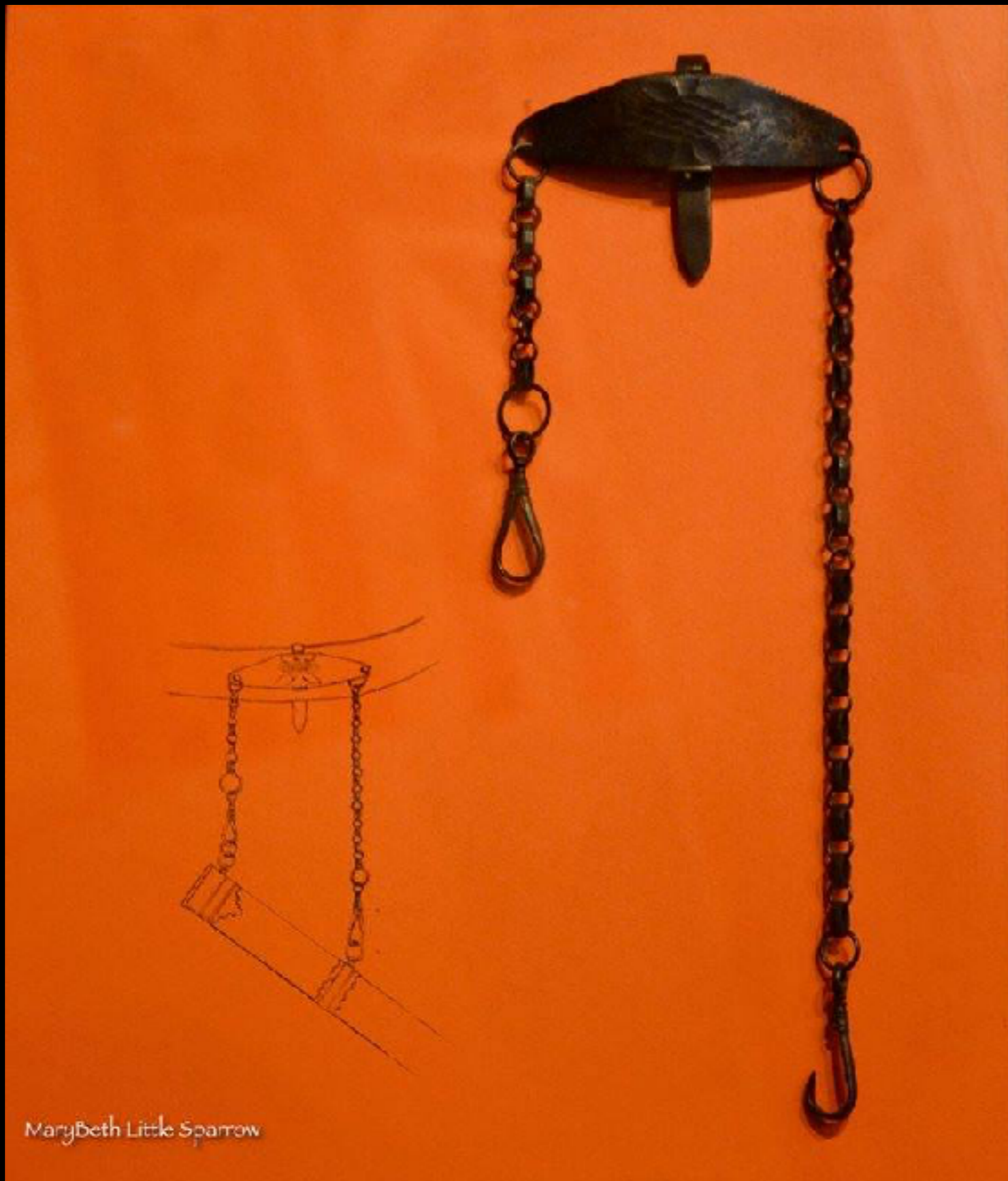
Cut Steel Sword Hanger 18th Century (Fort Laurens)