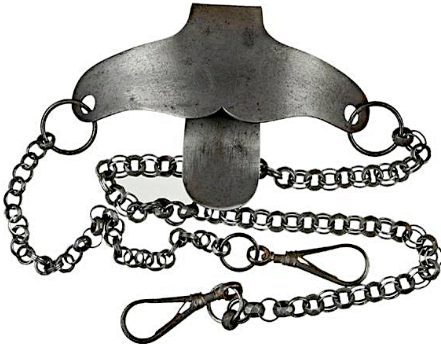
Cut Steel Sword Hanger Late 18th Century (Private Collection)