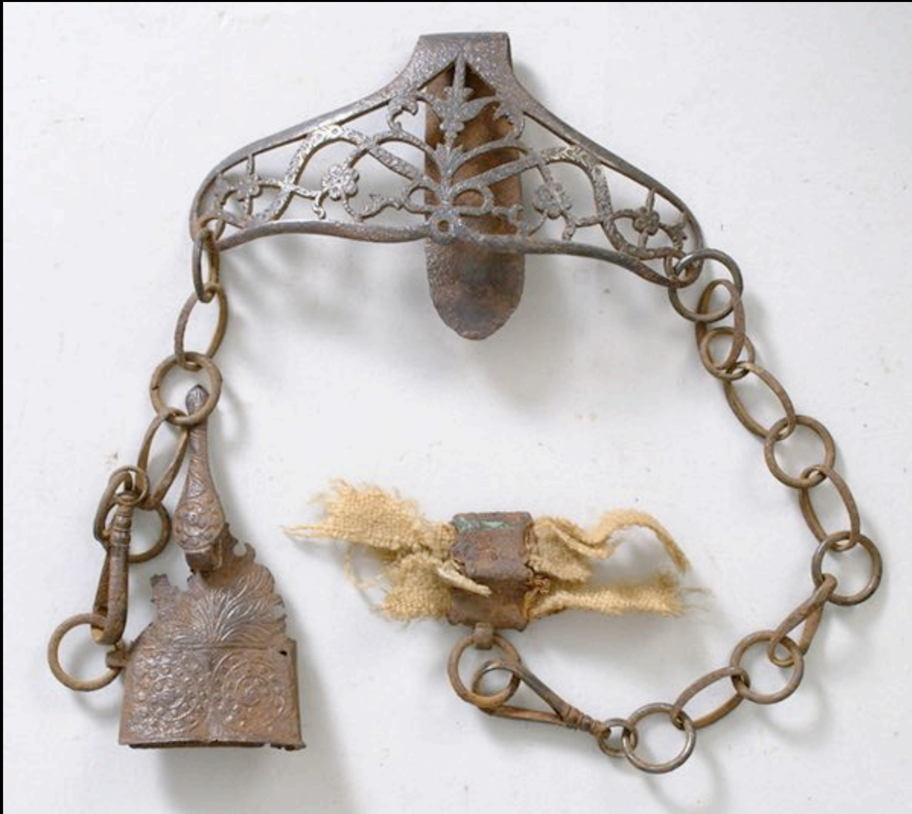
Cut Steel Sword Hanger Late 18th Century (Estate of Tom Wnuck)