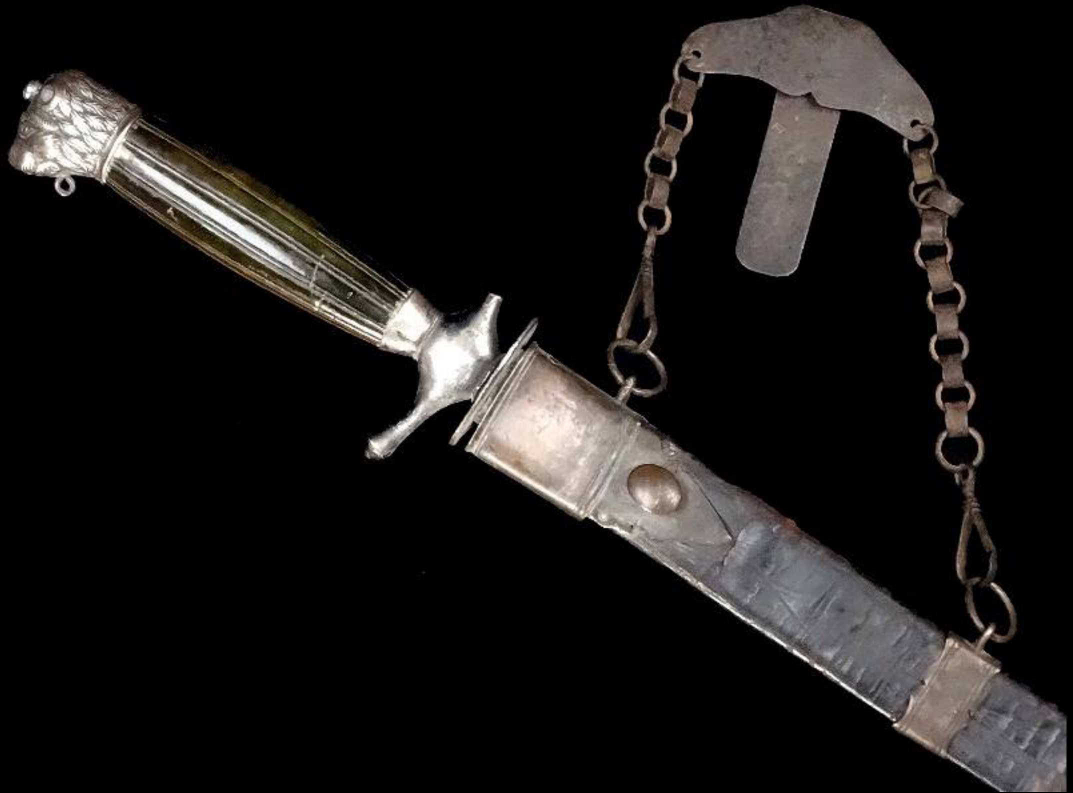
Cut Steel Sword Hanger 18th Century (Private Collection)