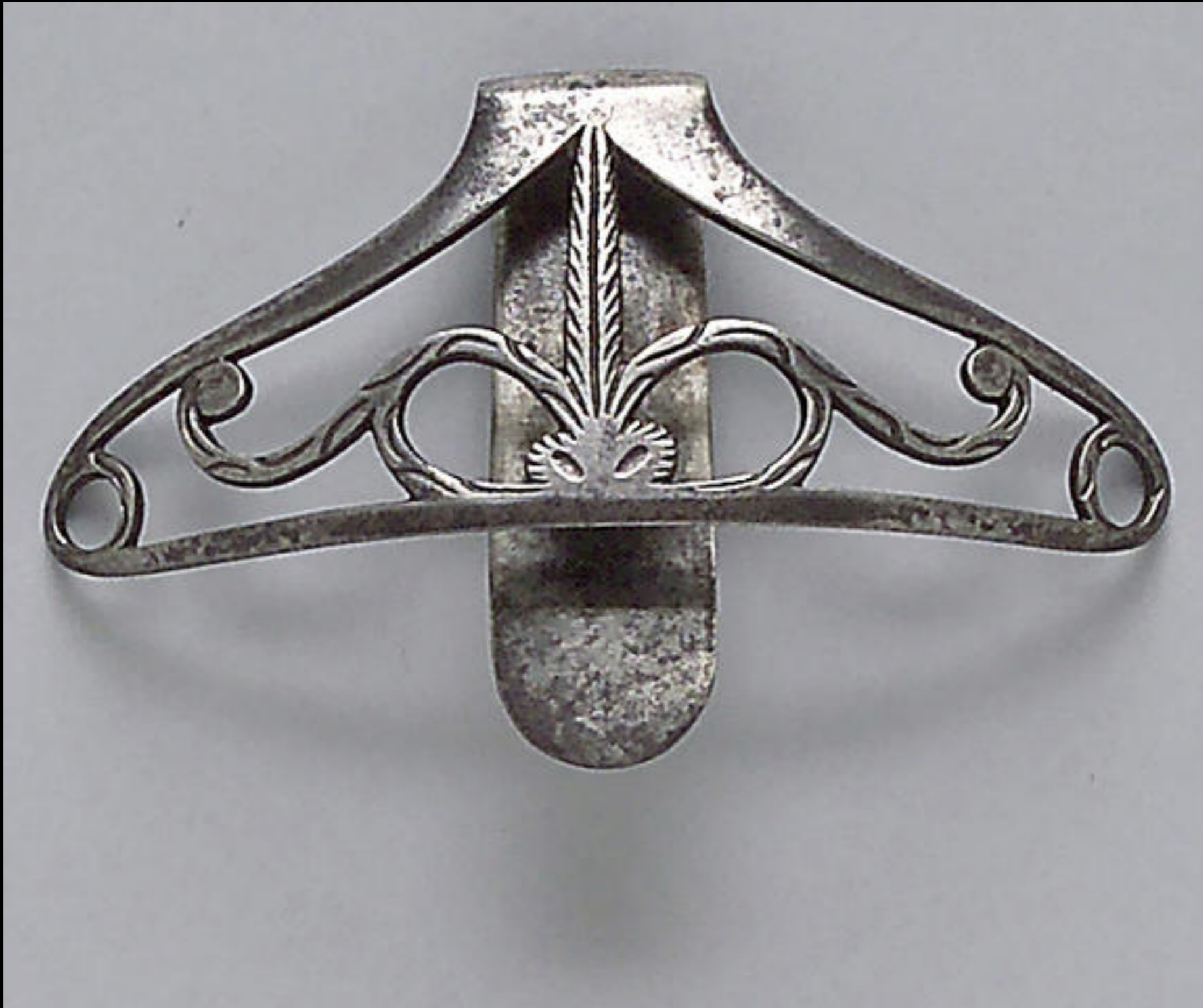
Cut Steel Sword Hanger Late 18th Century