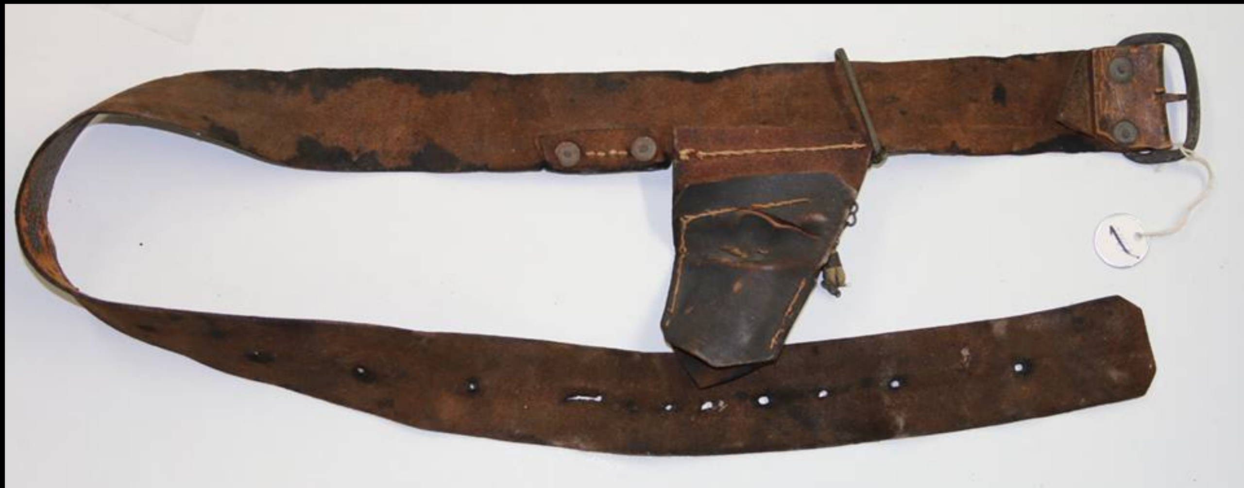
Recycled American or British Waistbelt Employing Iron Washers Typically Used by the British History of Bayonet Frog Removal and Addition of a Sword Frog (Don Troiani)