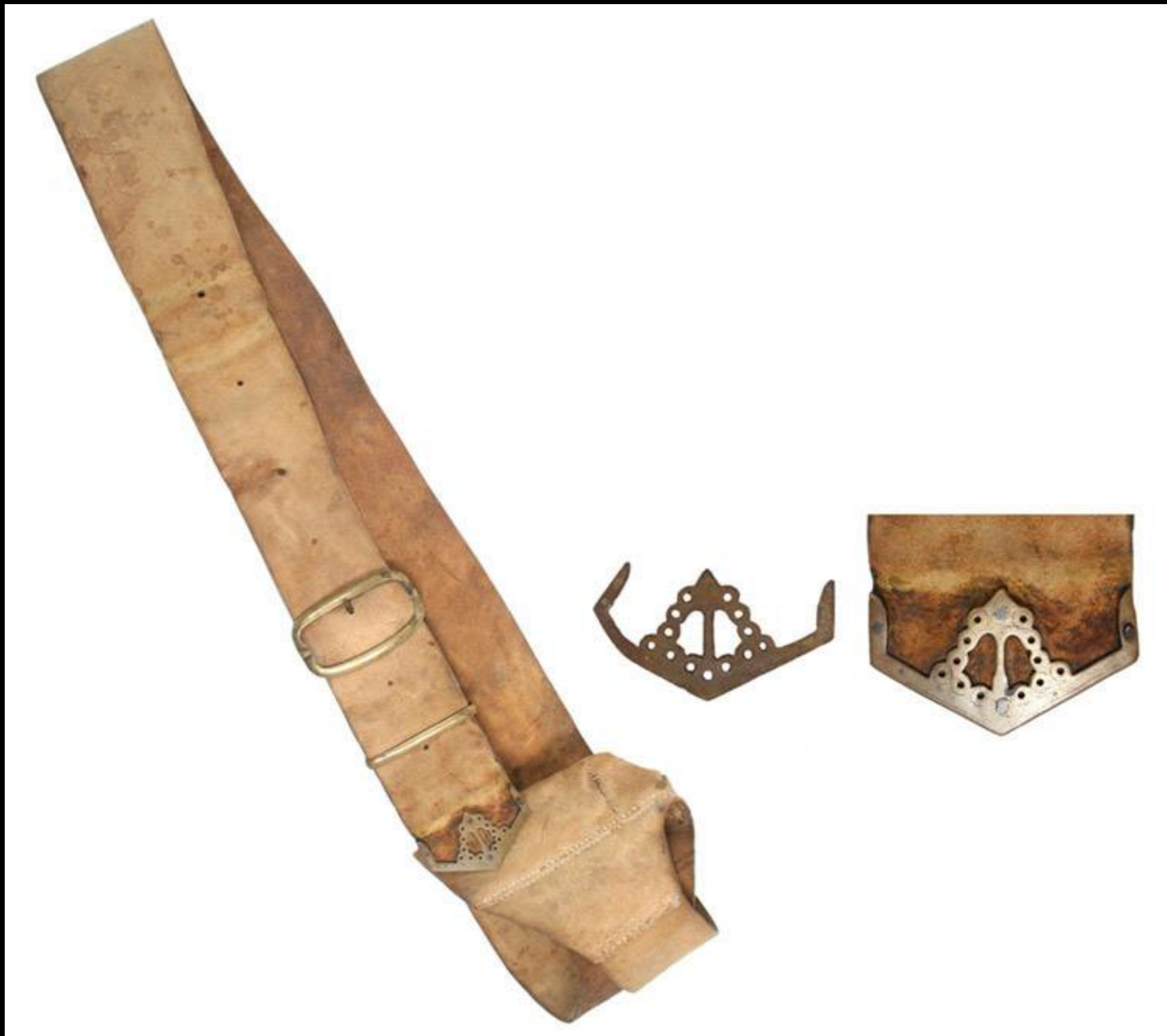
American Sword Belt & 13 Ring Belt Tip Excavated from a Late War Massachusetts Regiment Campsite c. 1780 - 1782