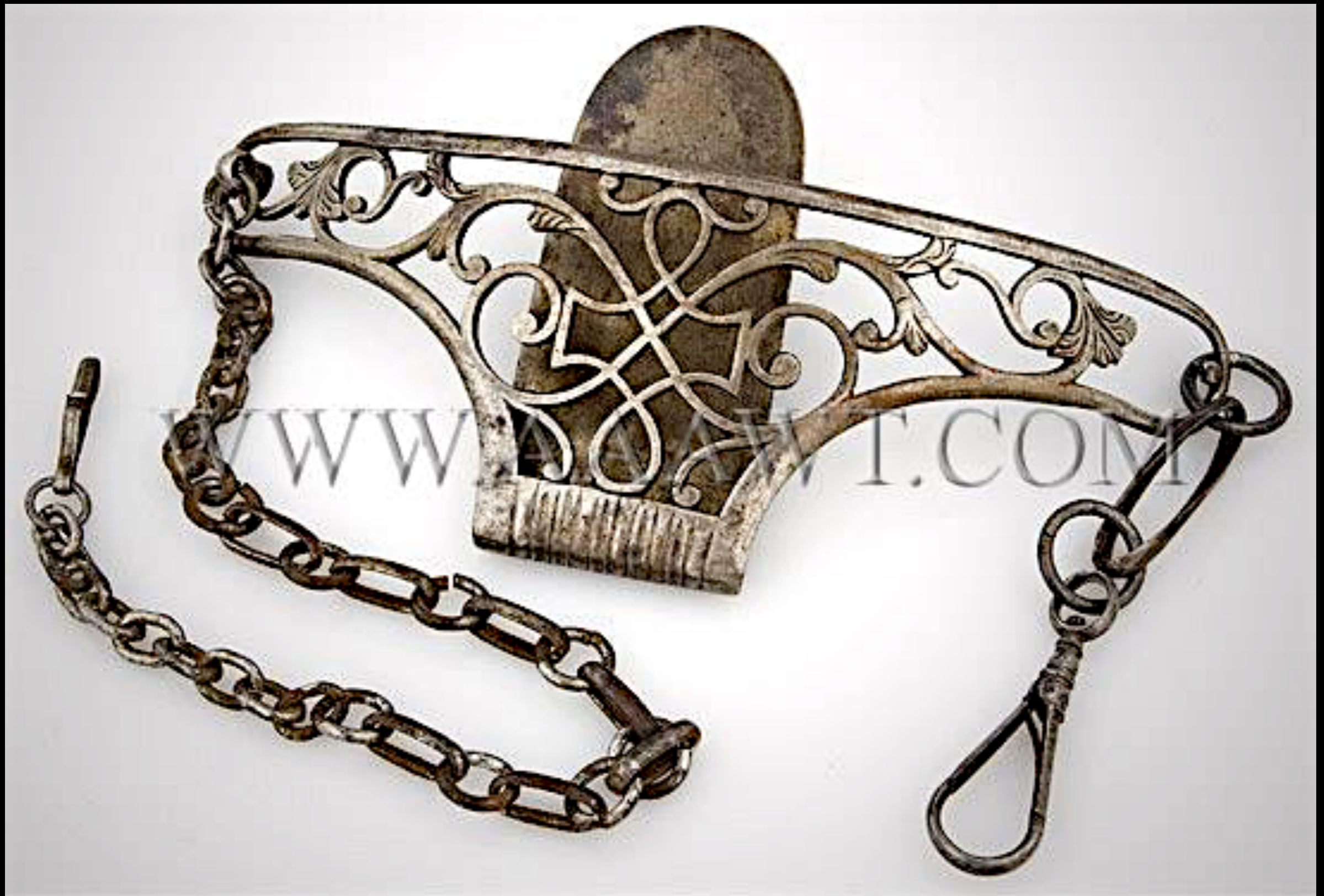
Cut Steel Sword Hanger Late 18th Century (Antique Associates of West Townsend)