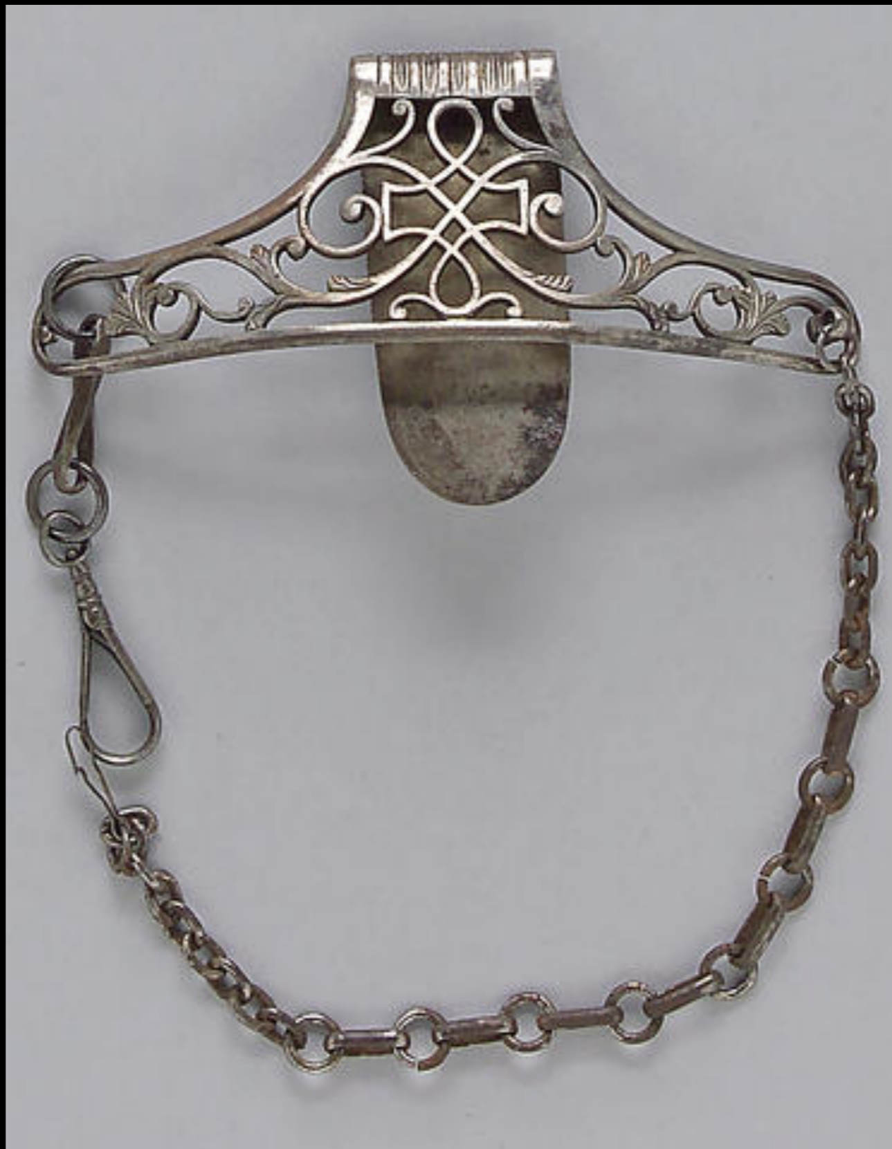
Cut Steel Sword Hanger Late 18th Century