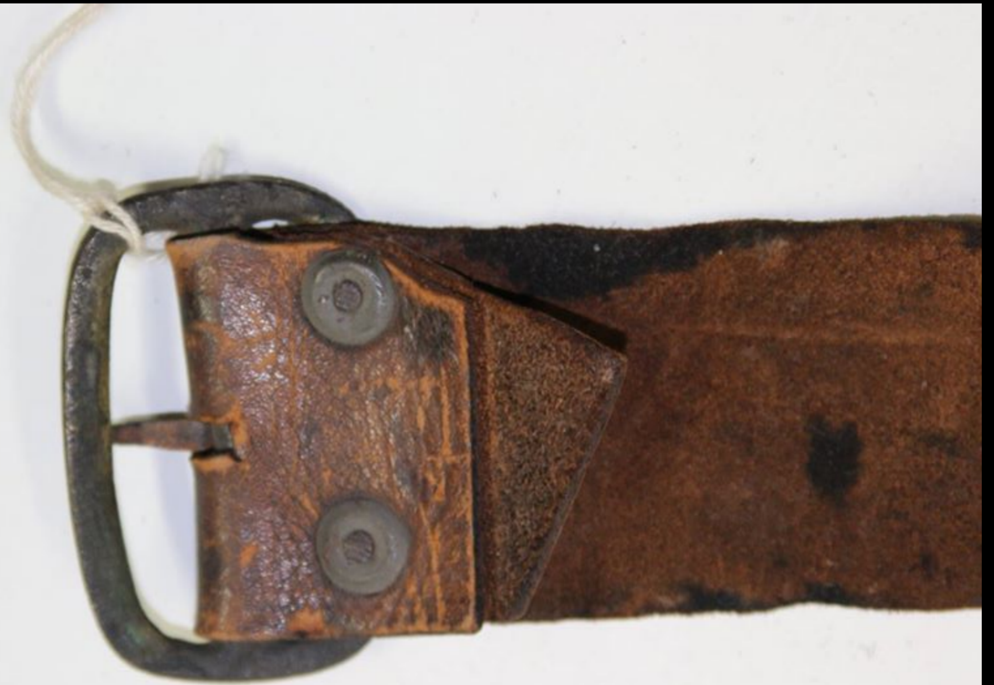
Recycled American or British Waistbelt Employing Iron Washers Typically Used by the British History of Bayonet Frog Removal and Addition of a Sword Frog (Don Troiani)