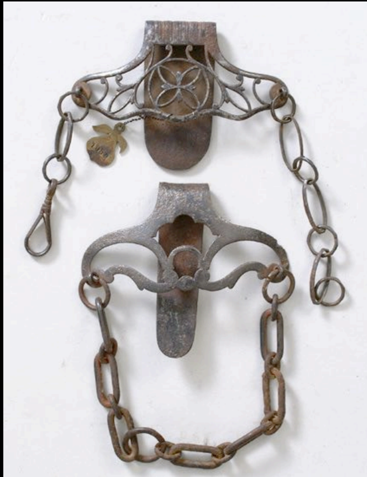
Cut Steel Sword Hangers Late 18th Century (Estate of Tom Wnuck)