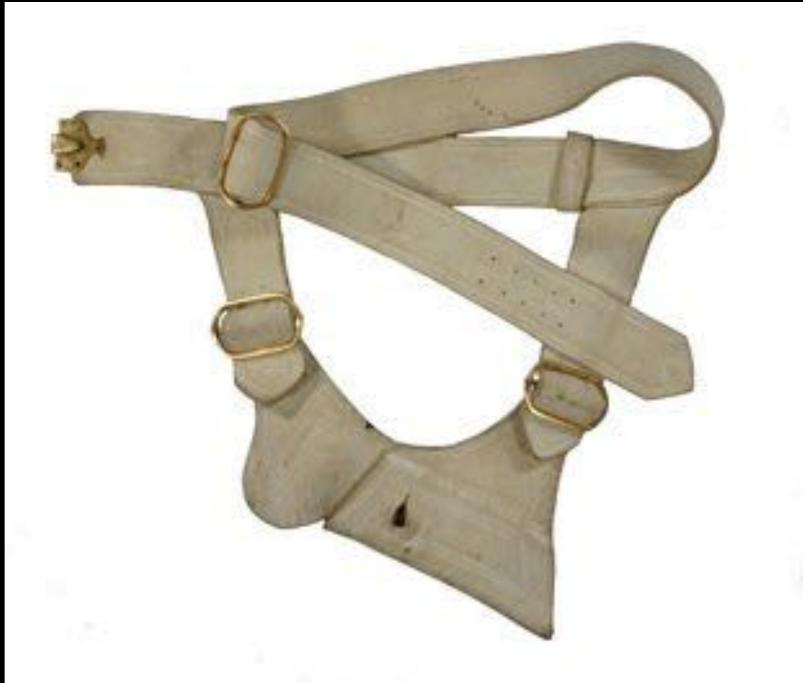
British Officer Waist Belt c. 1750 - 1760