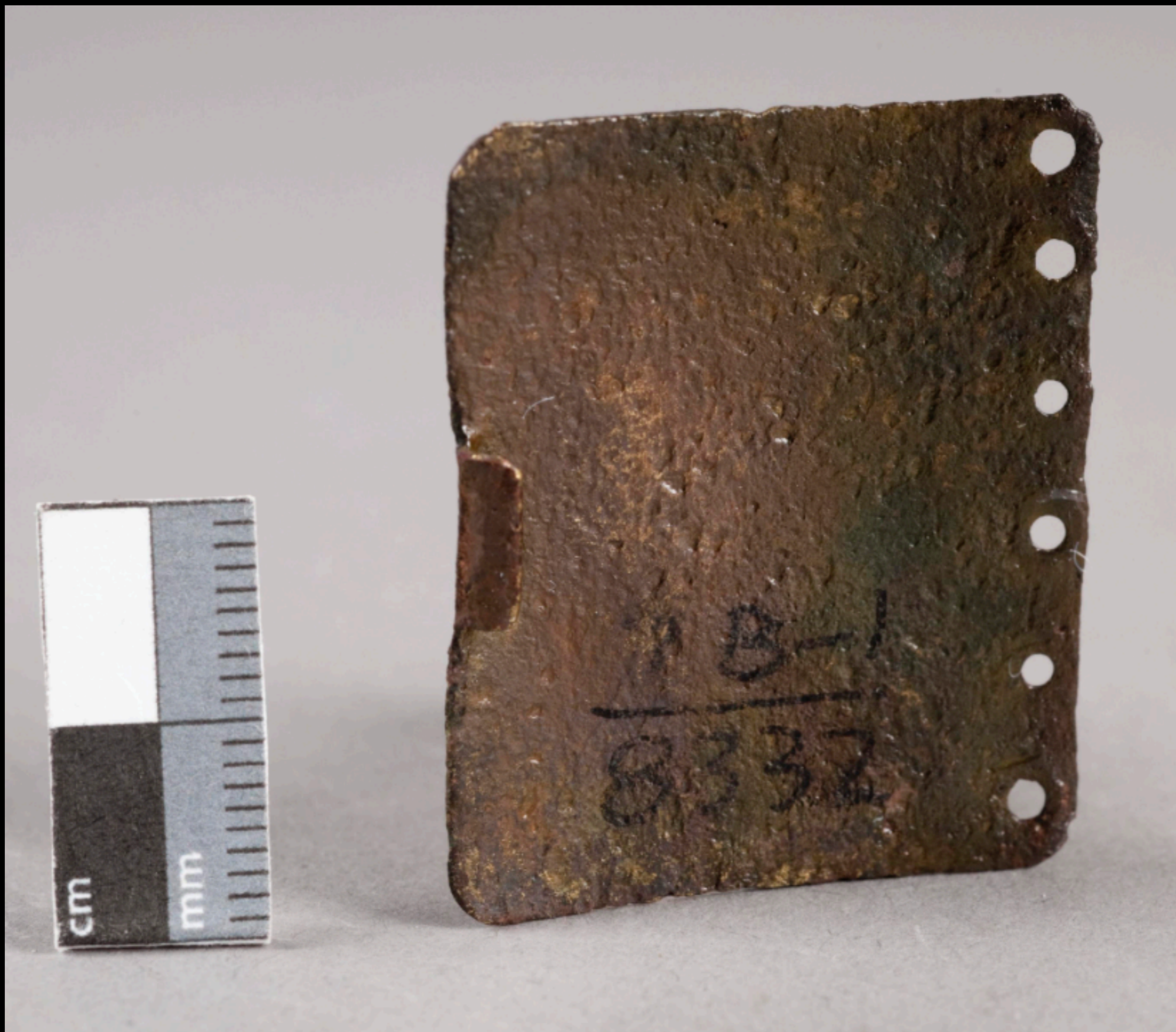
Neck Stock Clasp Recovered at Fort Stanwix, New York (Fort Stanwix, National Park Service)