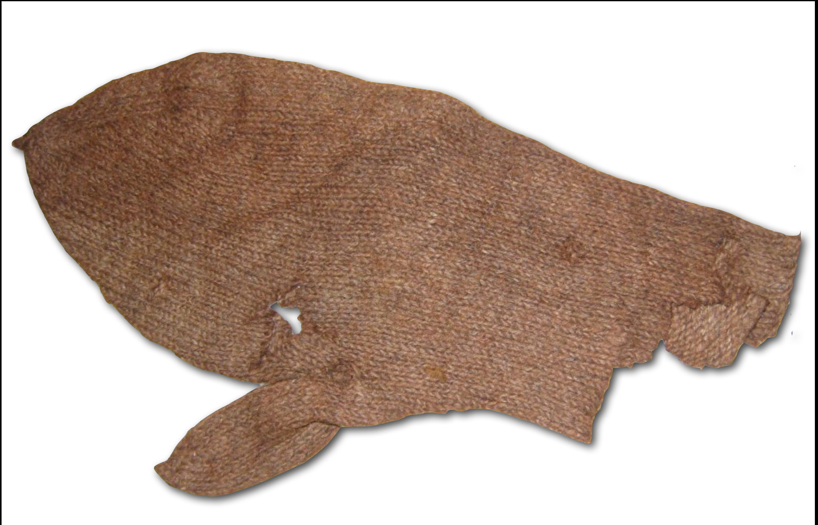
Mitten Found in a New York City Campsite