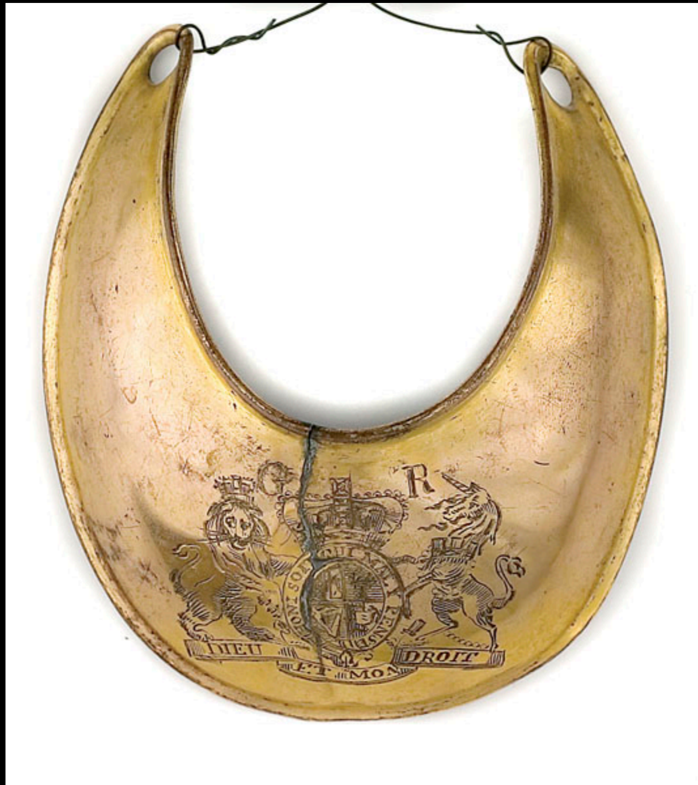
A British Officer's Gilt Brass Gorget (Private Collection)