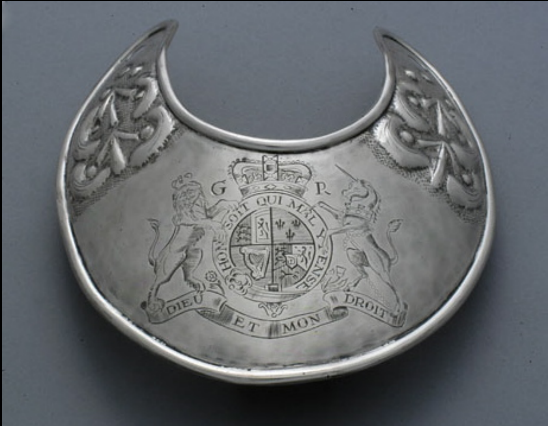
A British Officer's Silver Gorget