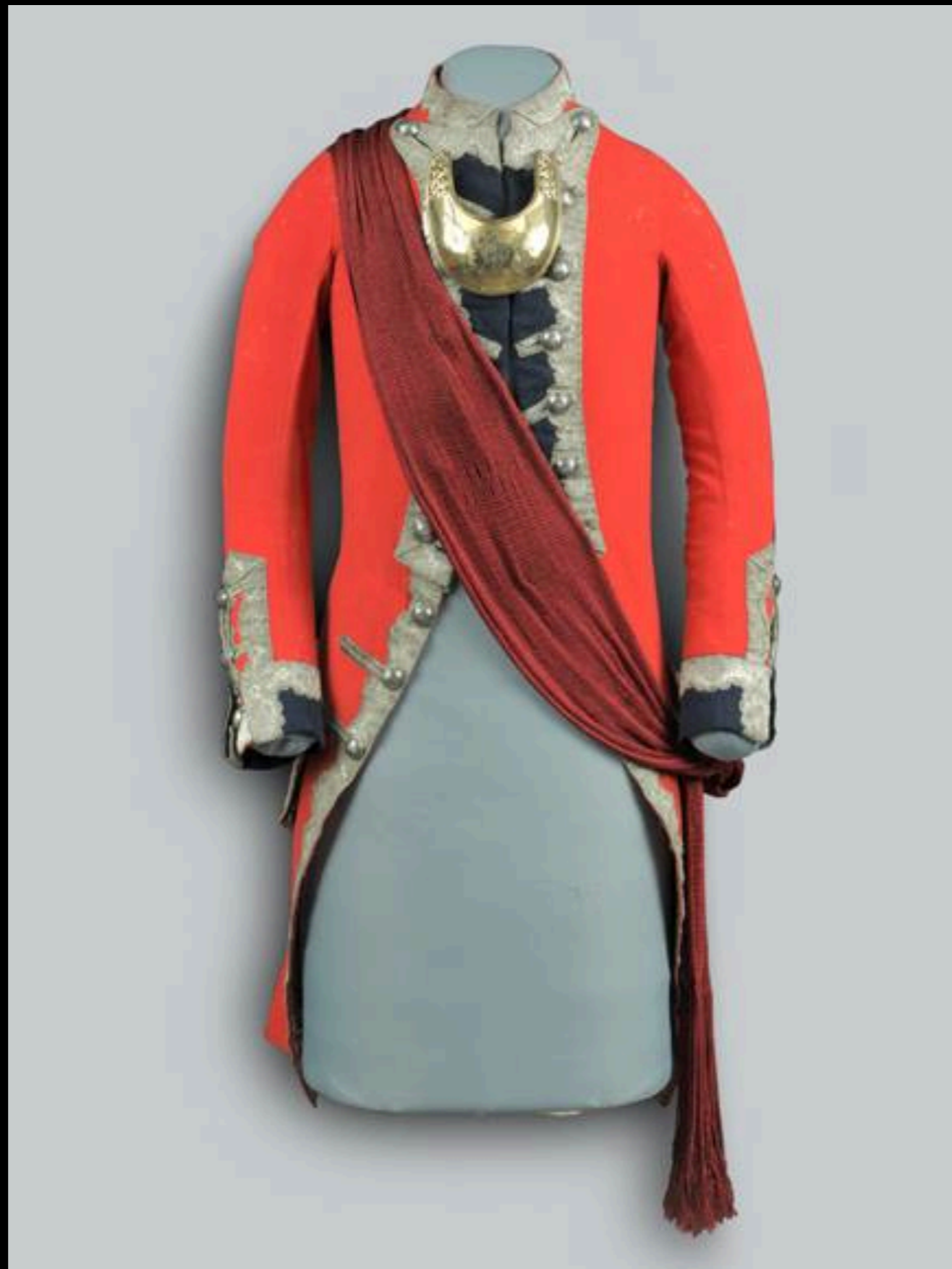
British Officer's Coat with Gorget & Sash c. 1760 - 1764 (Fort Ligonier)