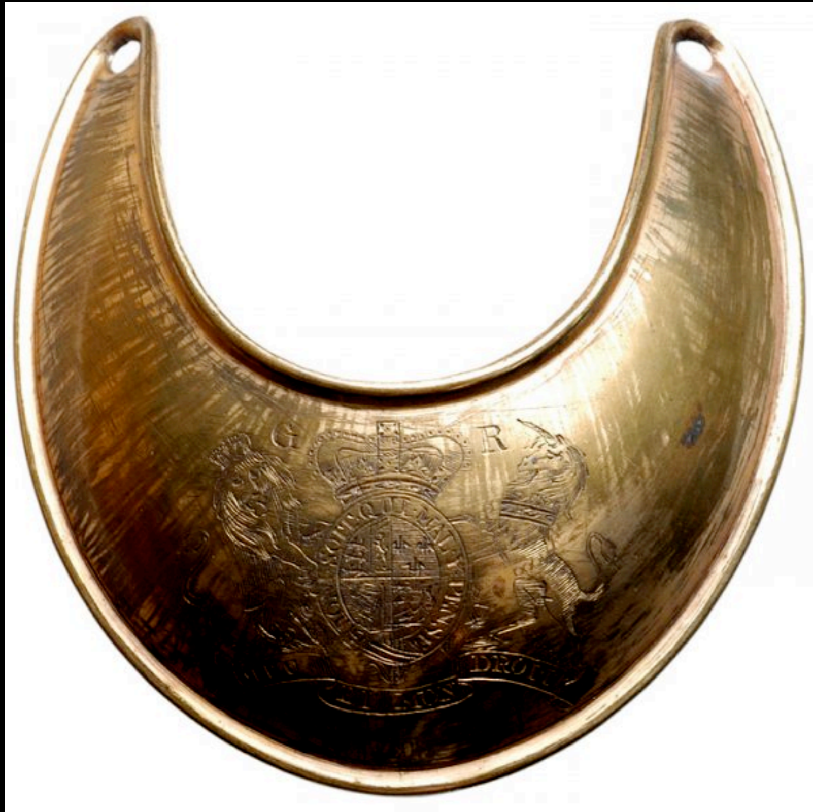
A British Officer's Gilt Brass Gorget (Private Collection)