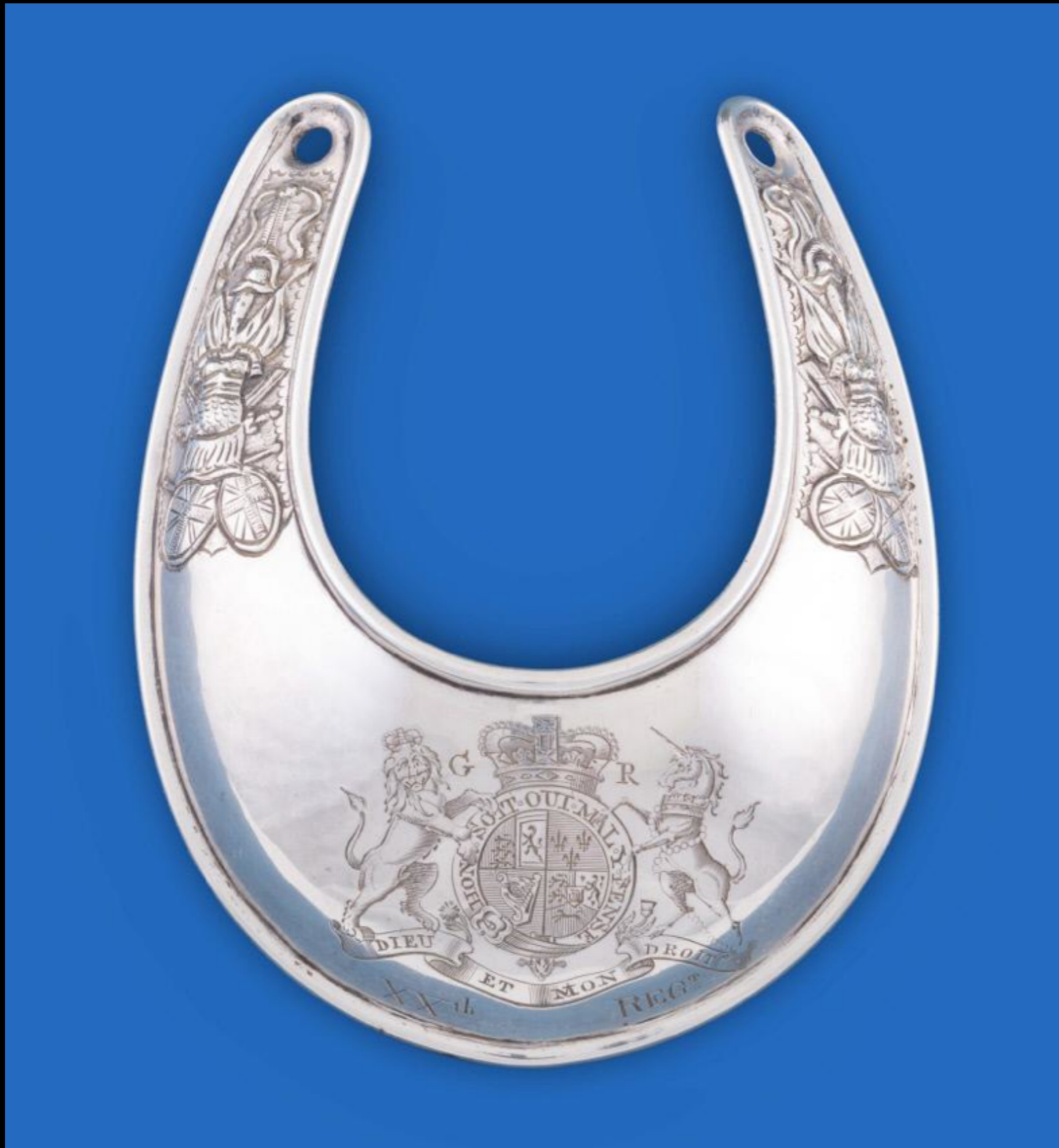
A British Officer's Gilt Brass Gorget Marked for H.M. 20th Regiment of Foot c. 1770