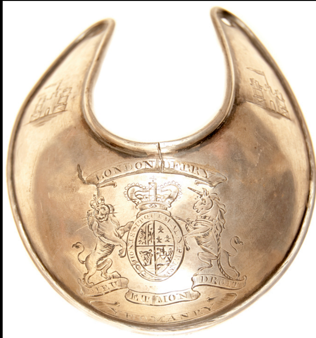
A British Officer's "Silver" Gorget Engraved "LONDON DERRY" and "YEOMANRY"