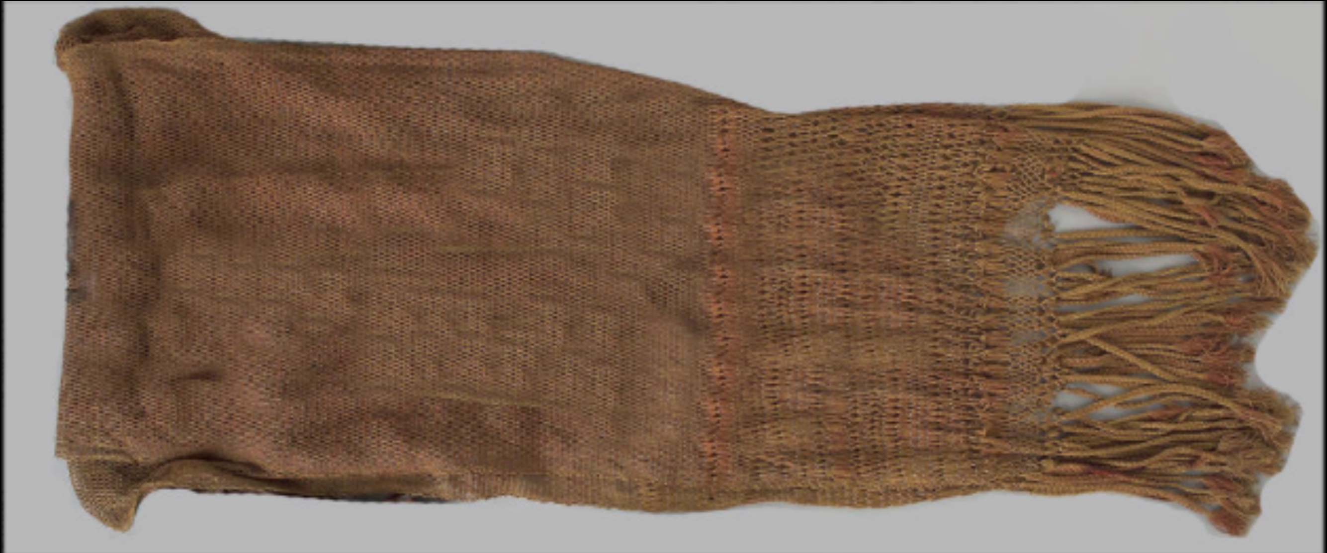
British Officer's Sash 2nd Half 18th Century