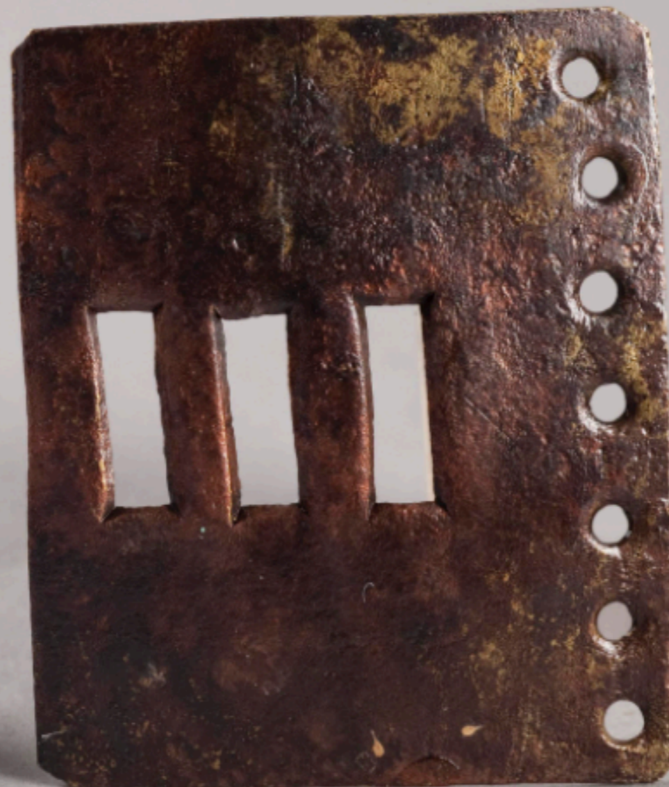
Neck Stock Clasp Recovered at Fort Stanwix, New York