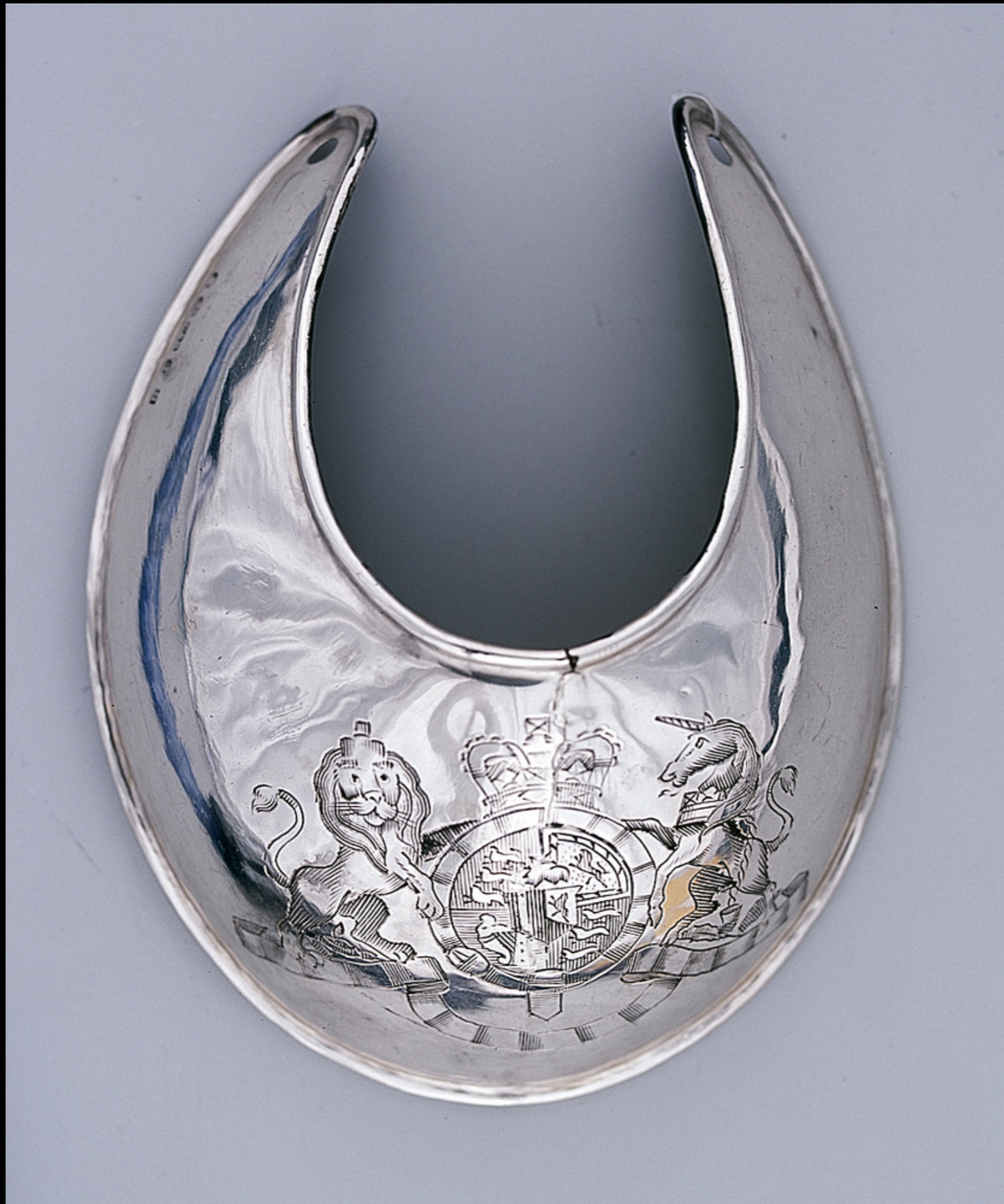
A British Officer's Silver Gorget (National Army Museum)