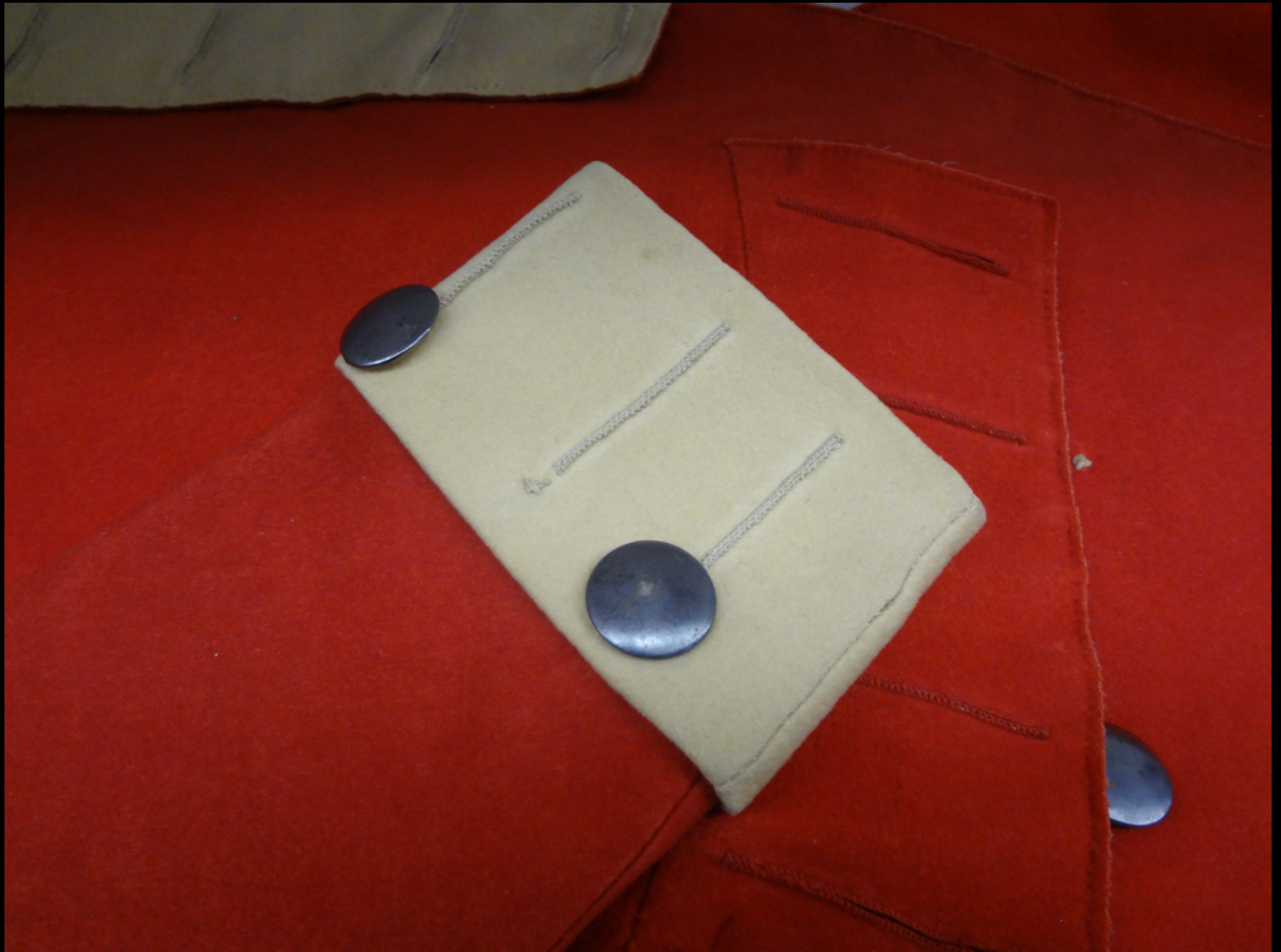
Coat of the Boston Corps of Cadets c. 1770 (Fort Ticonderoga)