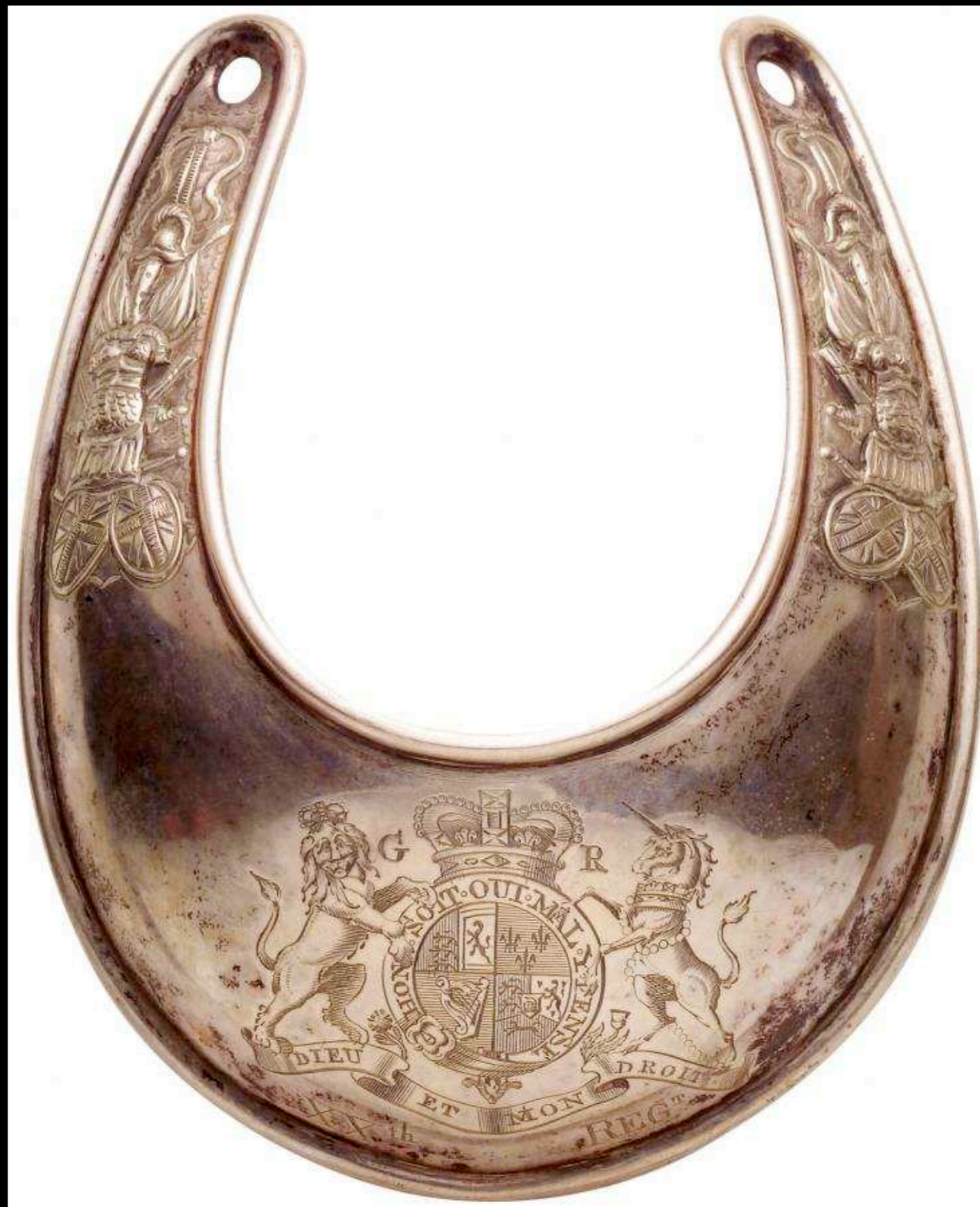
Officer's Gorget H.M. 20th Regiment of Foot