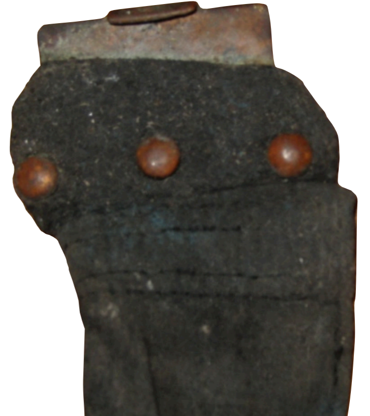
Neck Stock with Brass Clasp c. 1770 (Private Collection)