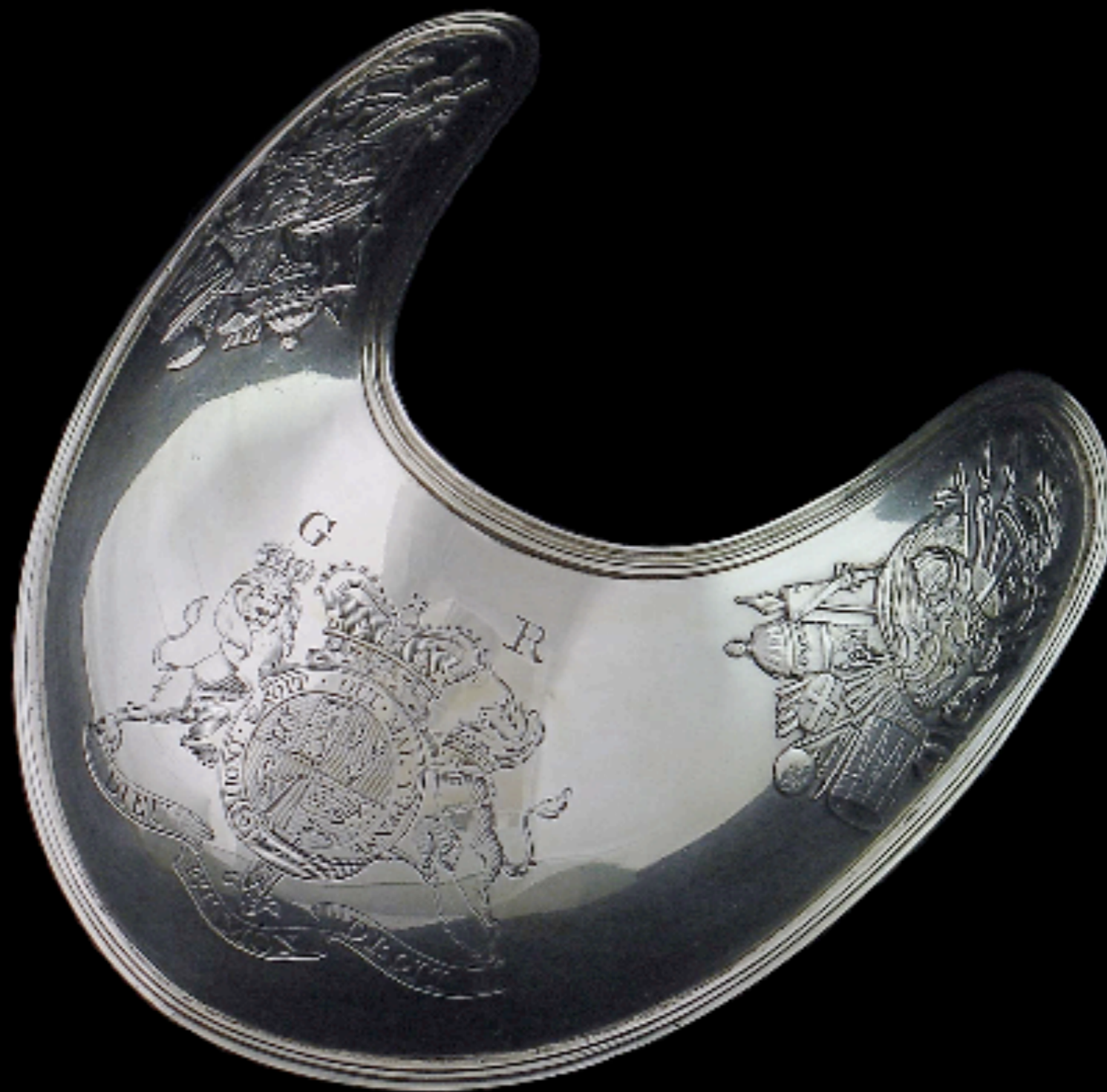
A British Officer's Silver Gorget (Museum of the American Revolution)