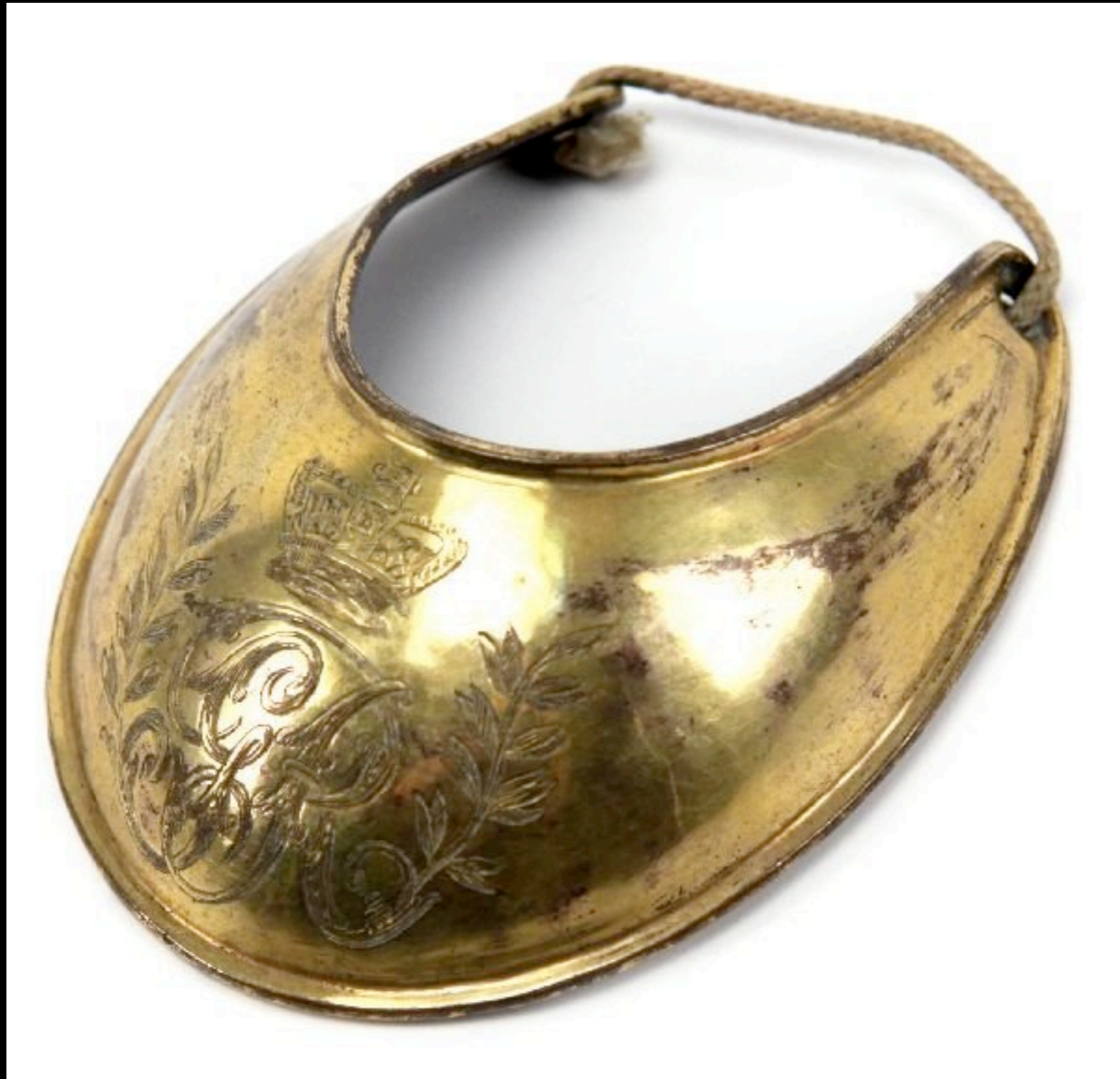
A British Officer's Gilt Brass Gorget