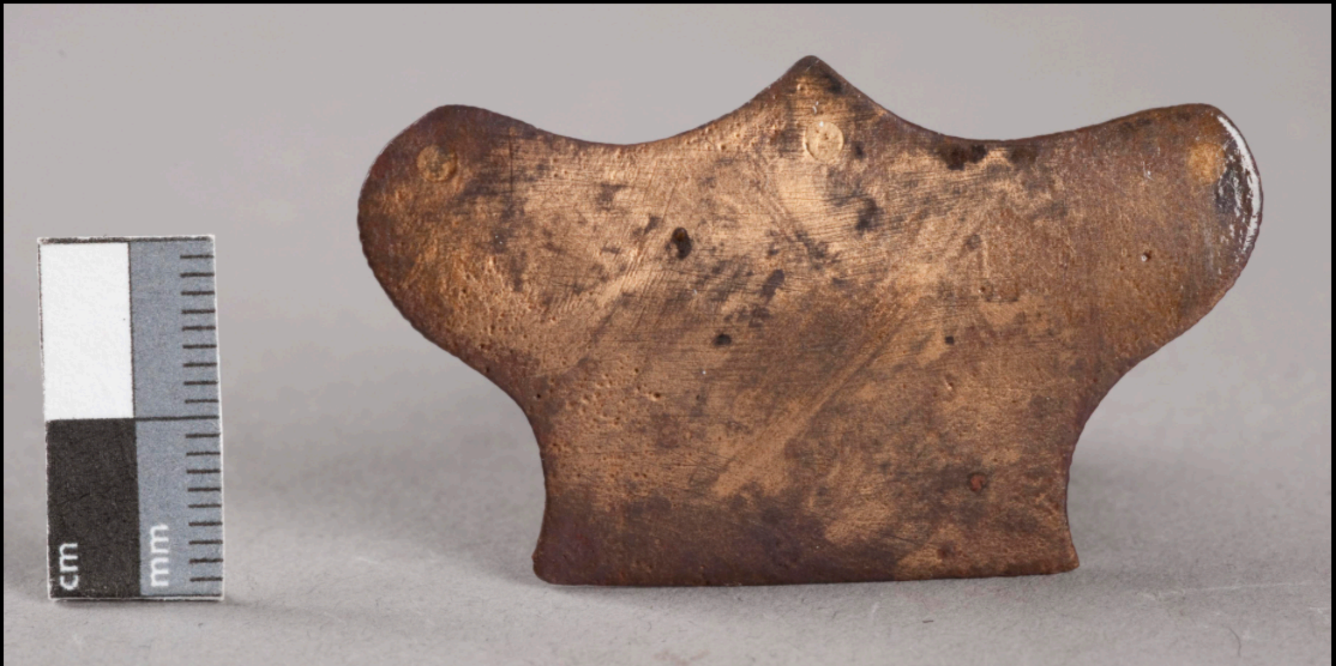
Neck Stock Clasp Recovered at Fort Stanwix, New York