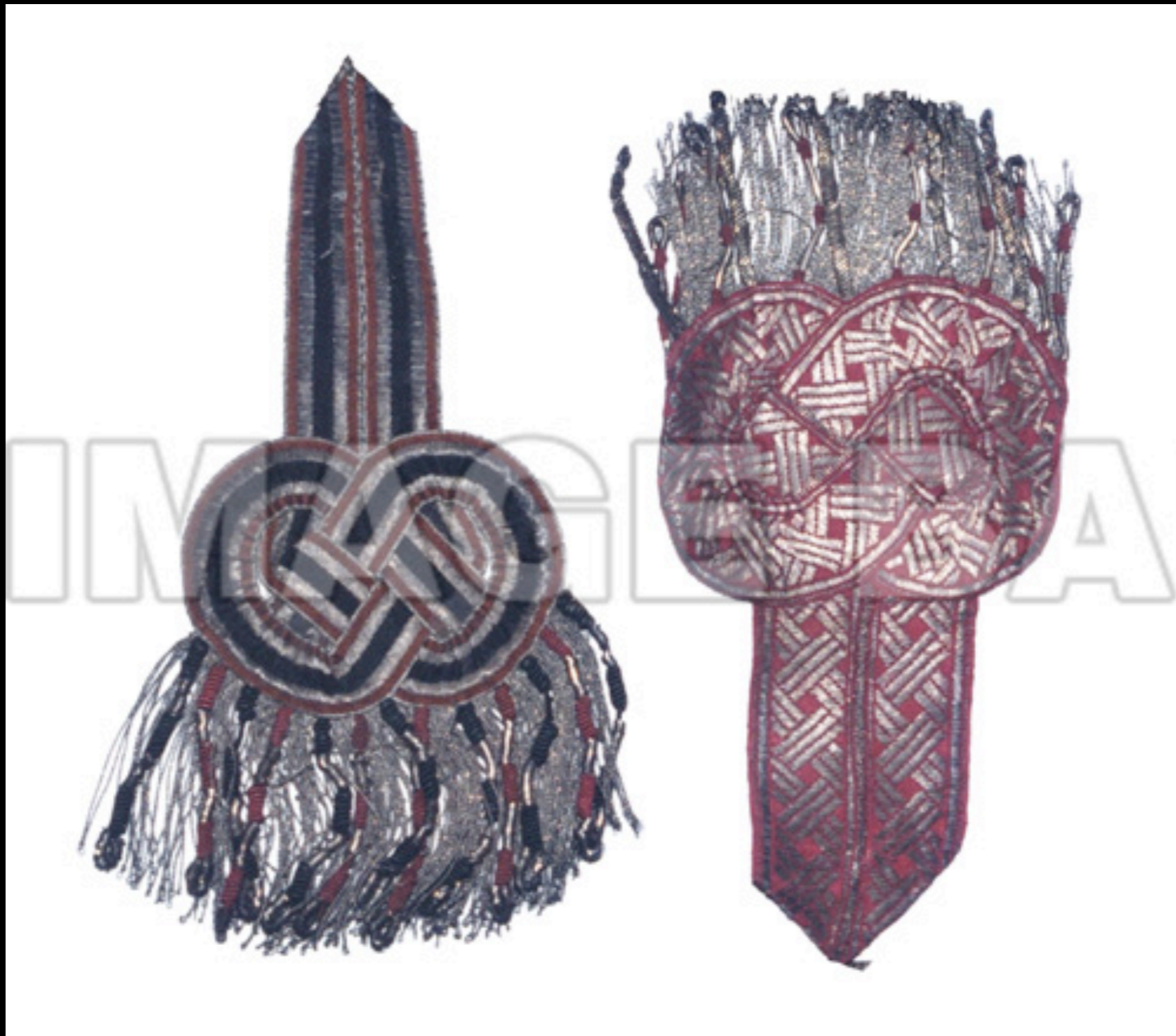
British Officer's Silver Embroidered Epaulettes