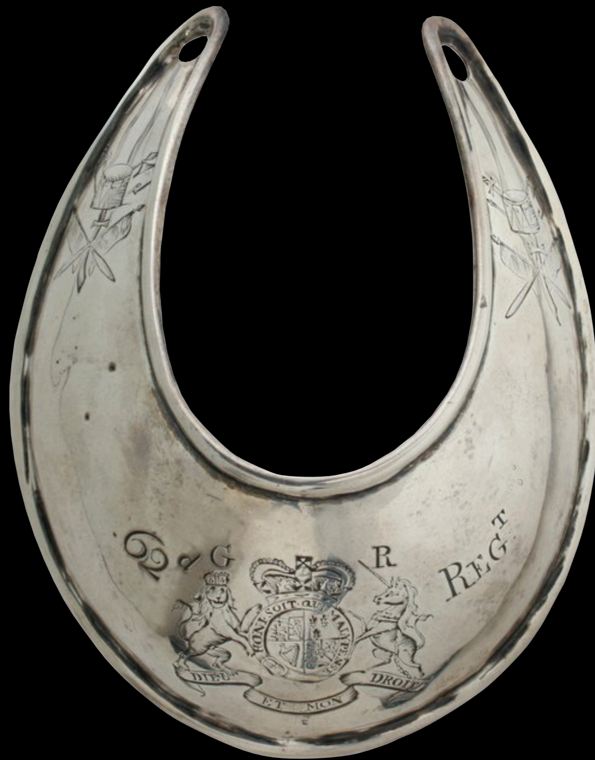
Gorget H.M. 62nd Regiment of Foot