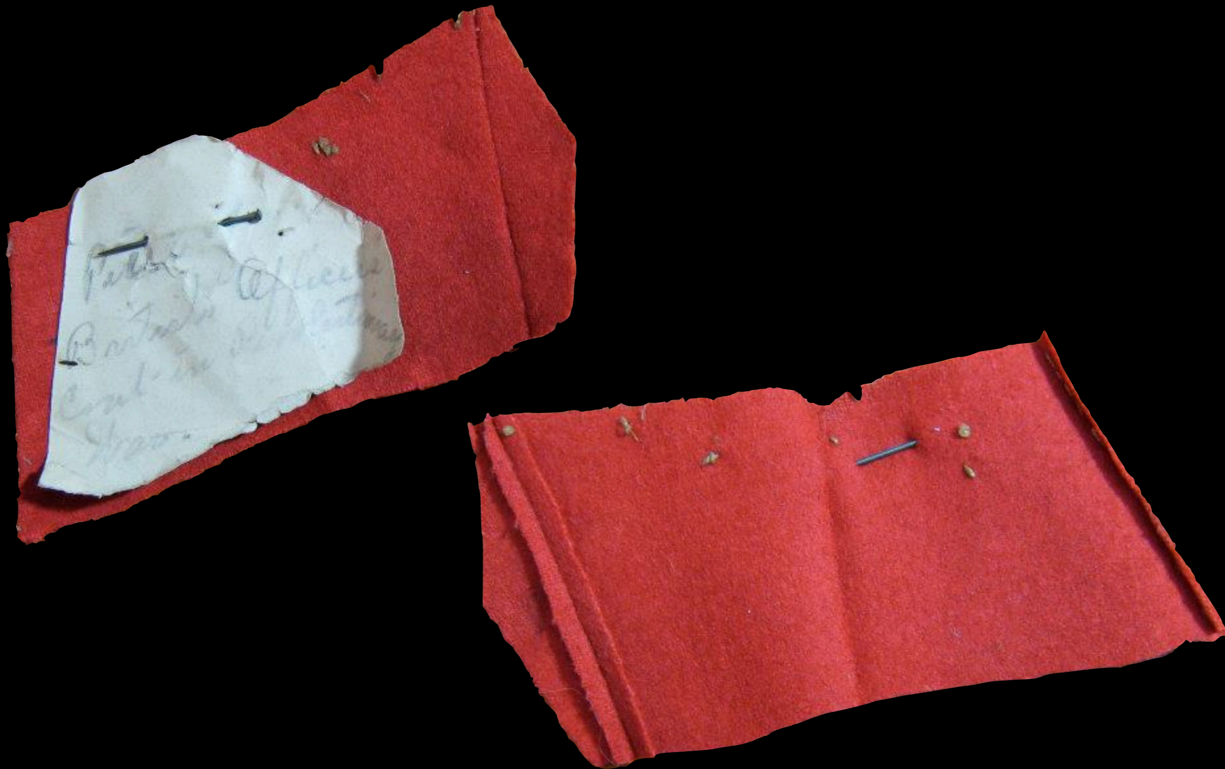
“Cloth from Coat of a British Officer of the Revolutionary War taken by a Lady from New Jersey” (Skinner)