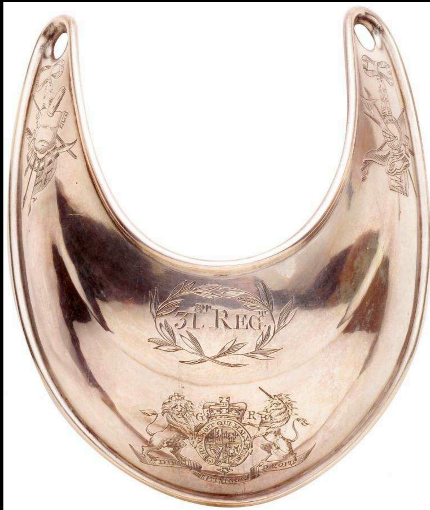
Officer's Gorget H.M. 31st Regiment of Foot