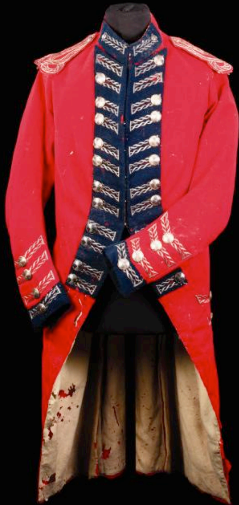
Field Officer's Scarlet Coat with Double Epaulettes