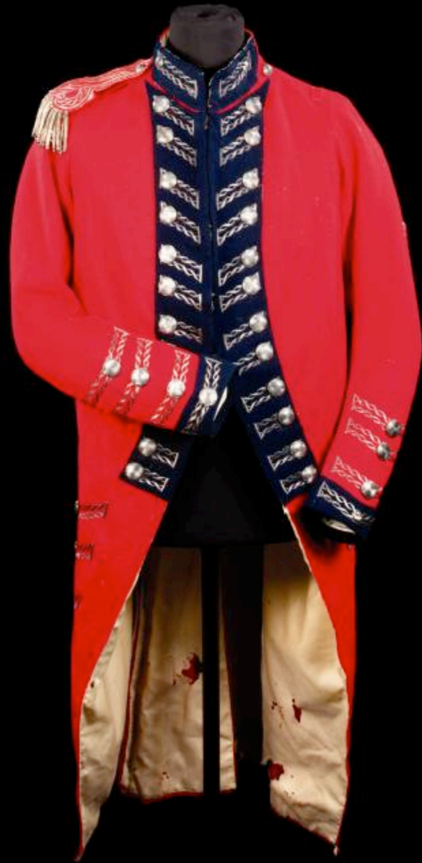
Field Officer's Scarlet Coat with Right Shoulder Epaulette