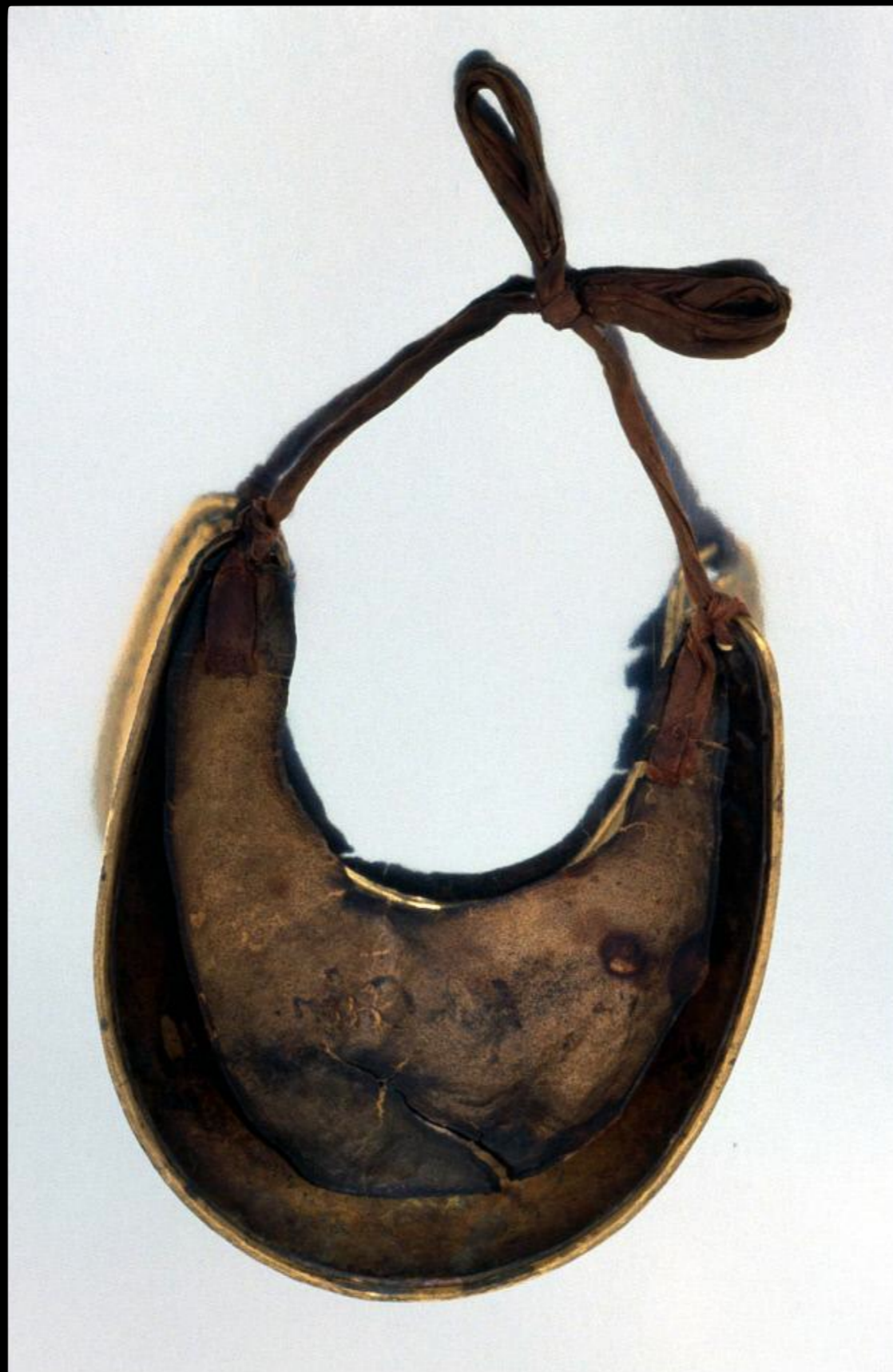
A British Officer's Gilt Brass Gorget c. 1750 - 1760 (Colonial Williamsburg Foundation)