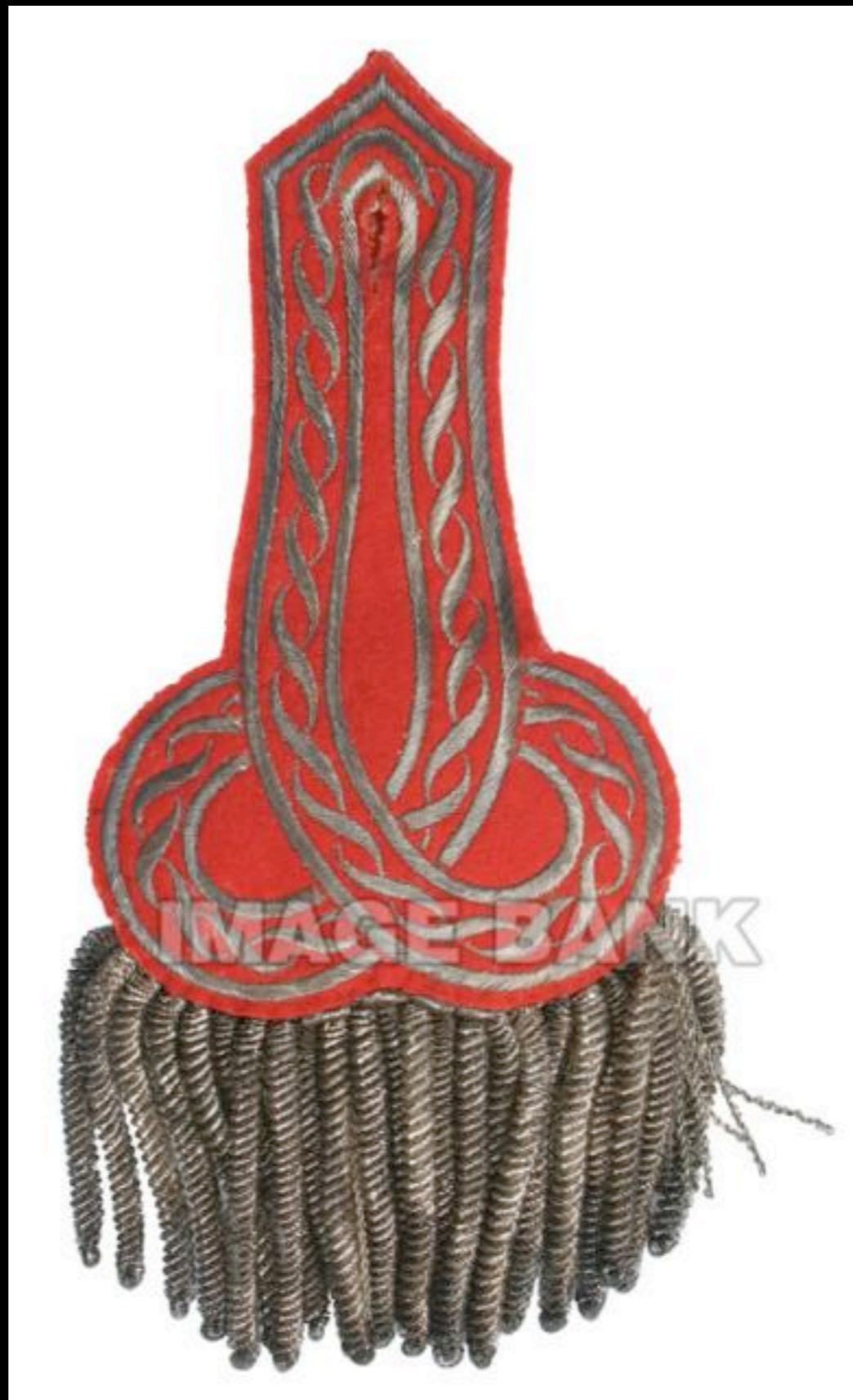
British Officer Silver Embroidered Epaulette