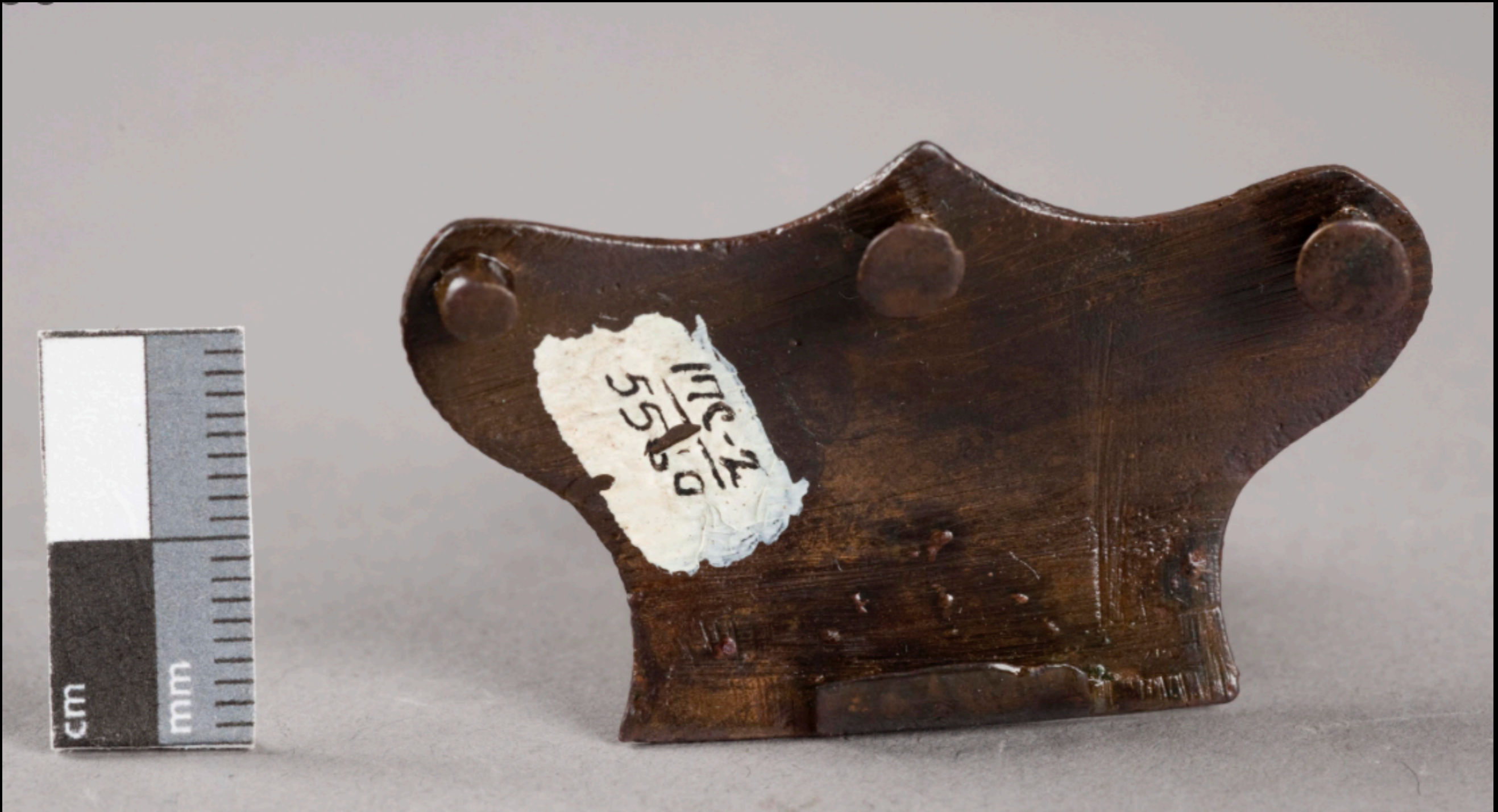
Neck Stock Clasp Recovered at Fort Stanwix, New York (Fort Stanwix, National Park Service)