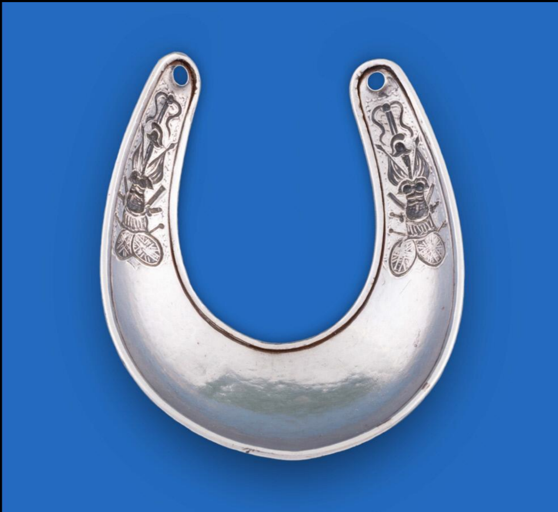
A British Officer's Gilt Brass Gorget Marked for H.M. 20th Regiment of Foot