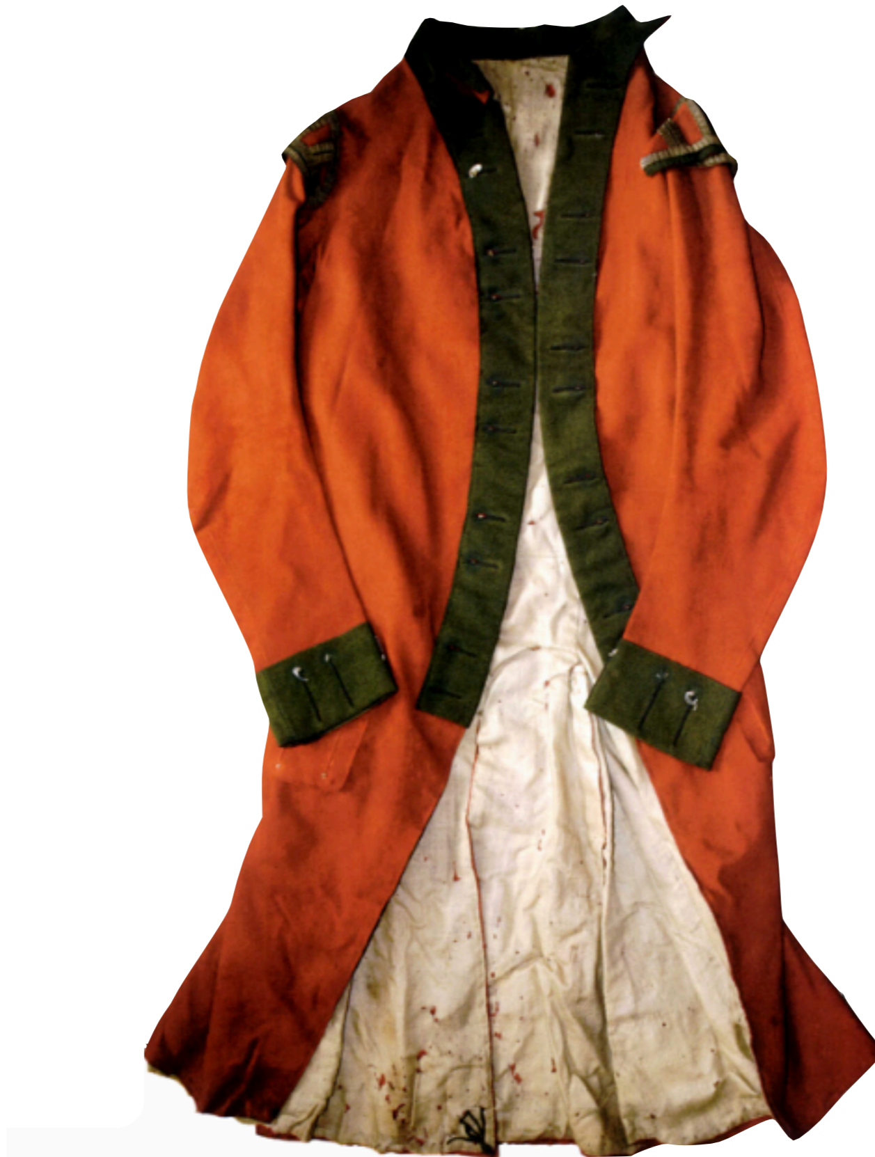
Grenadier Officer's Coat