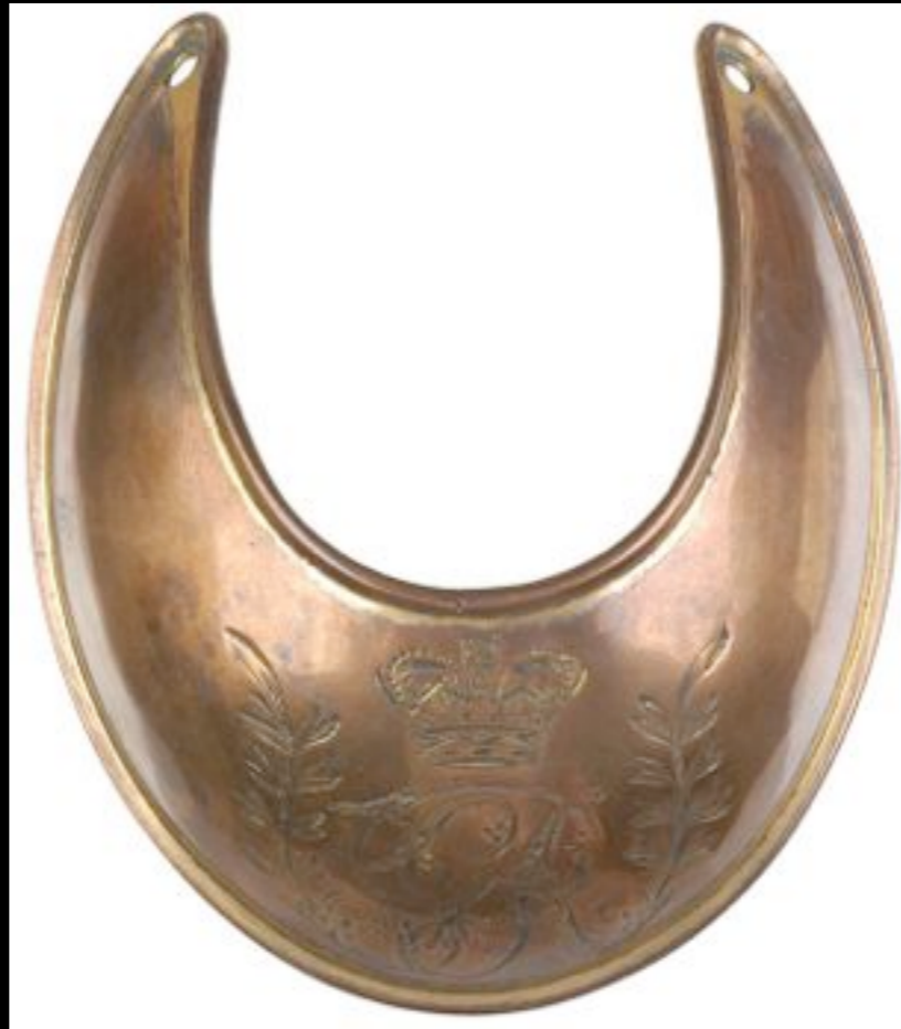
A British Officer's Gilt Brass Gorget