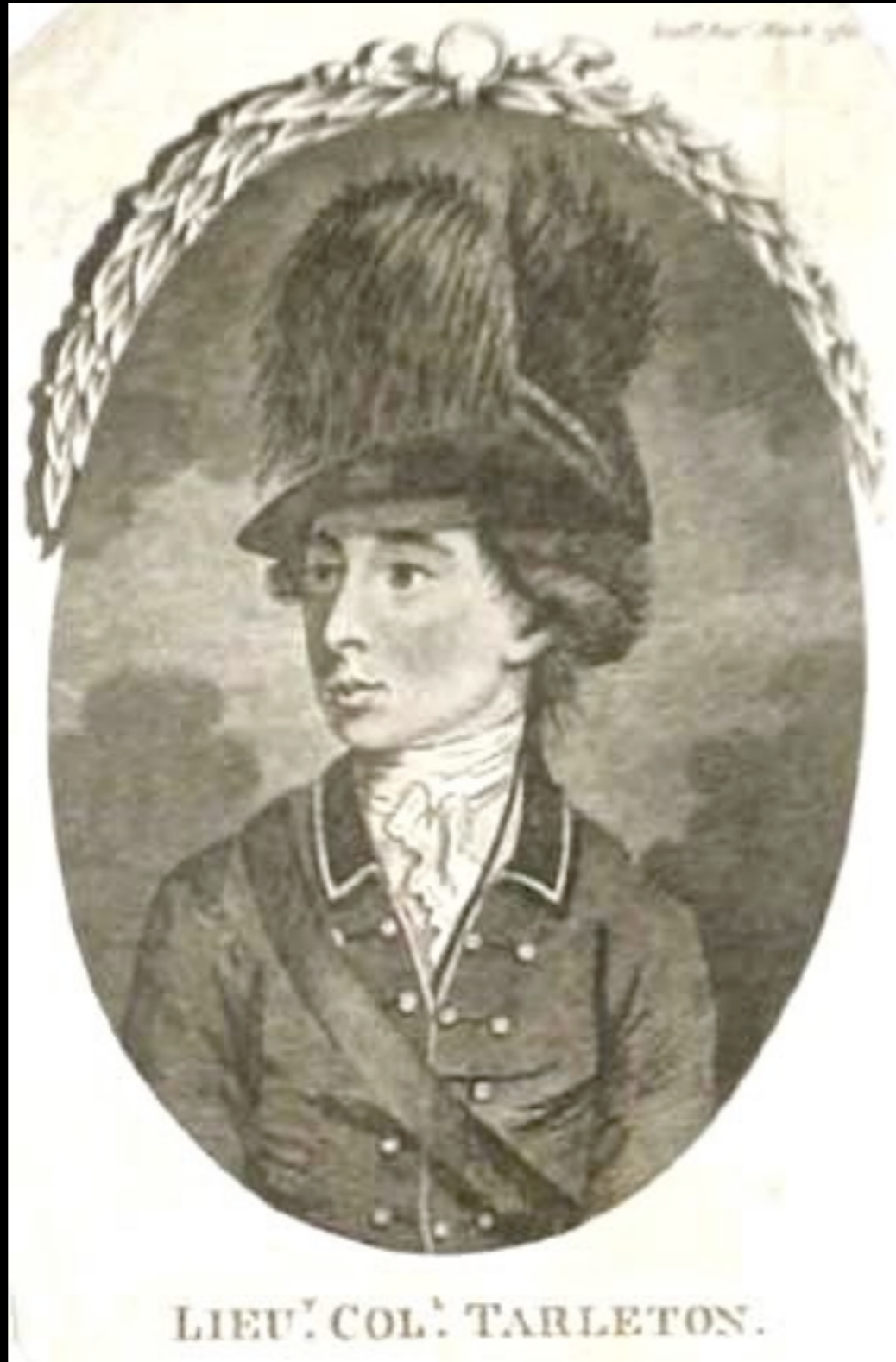
Lieutenant Colonel Banastre Tarleton The British Legion