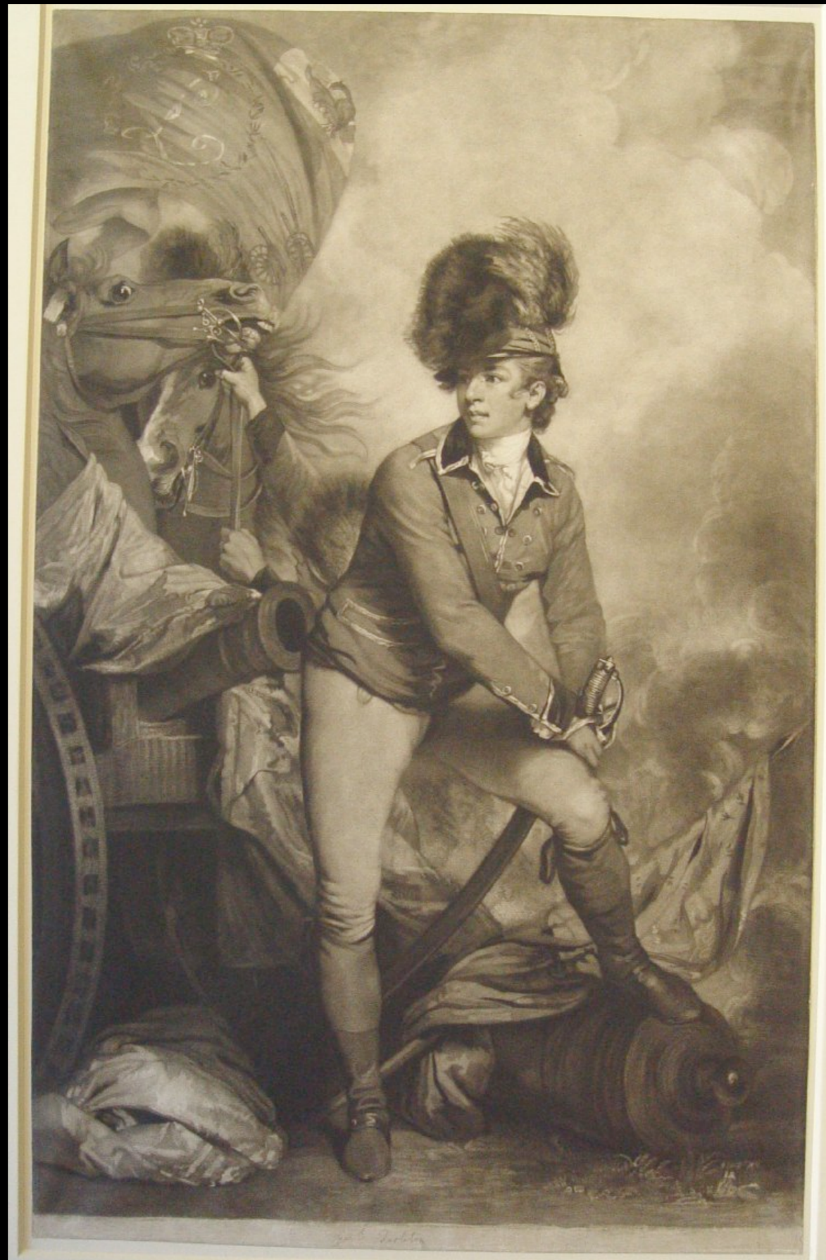
Lieutenant Colonel Banastre Tarleton by John Raphael Smith after Sir Joshua Reynolds 1782 (The British Museum)