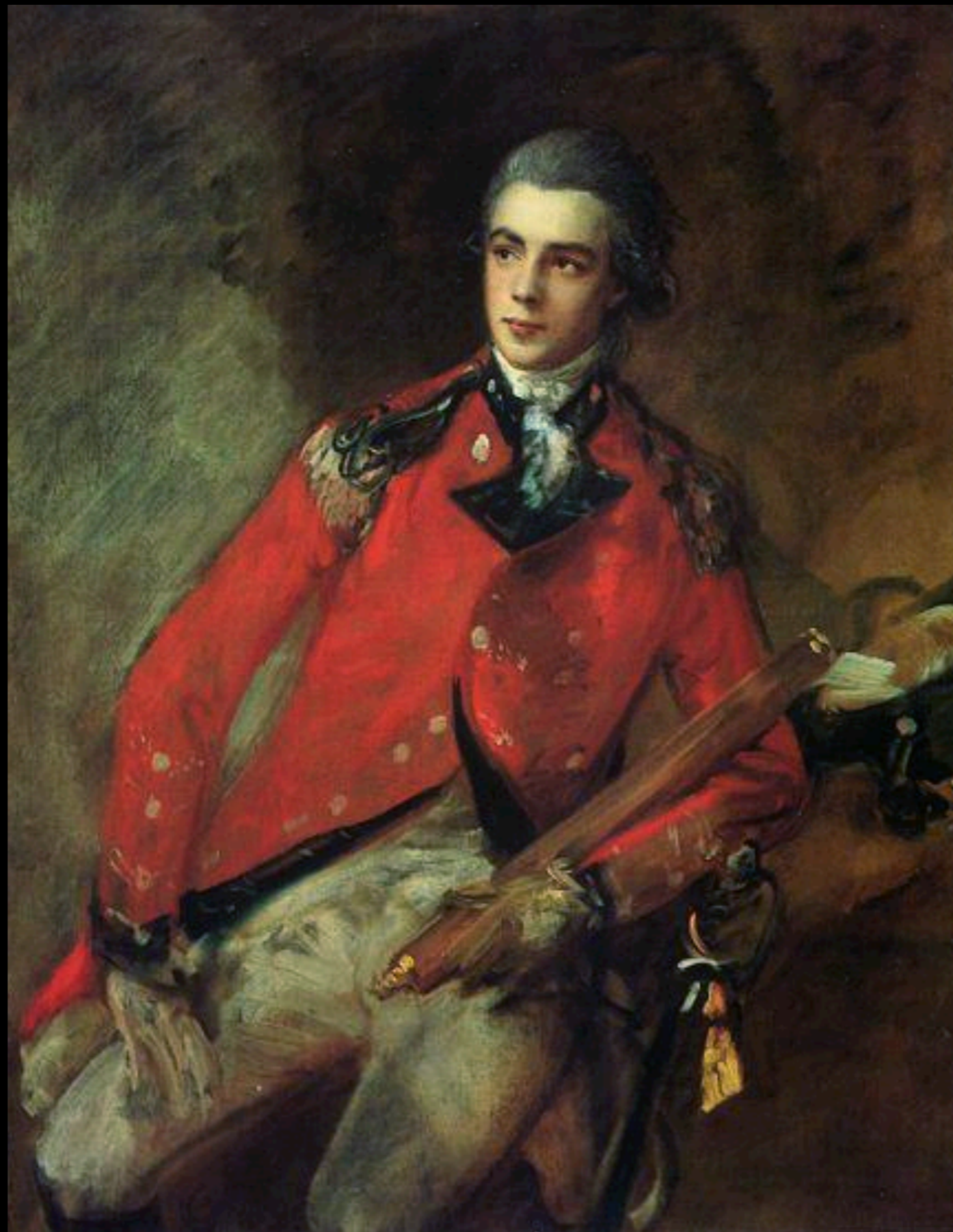
Lord Cathcart, Colonel of the British Legion by Gainsborough