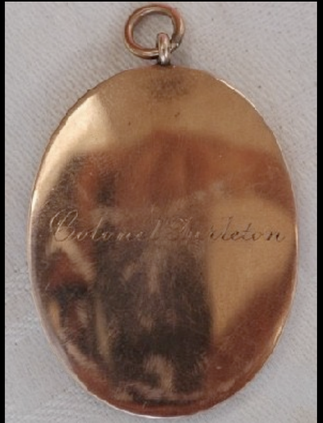
“Colonel Turlleton” - Possibly Banastre Tarleton While in England c. 1782 (Christopher Bryant)