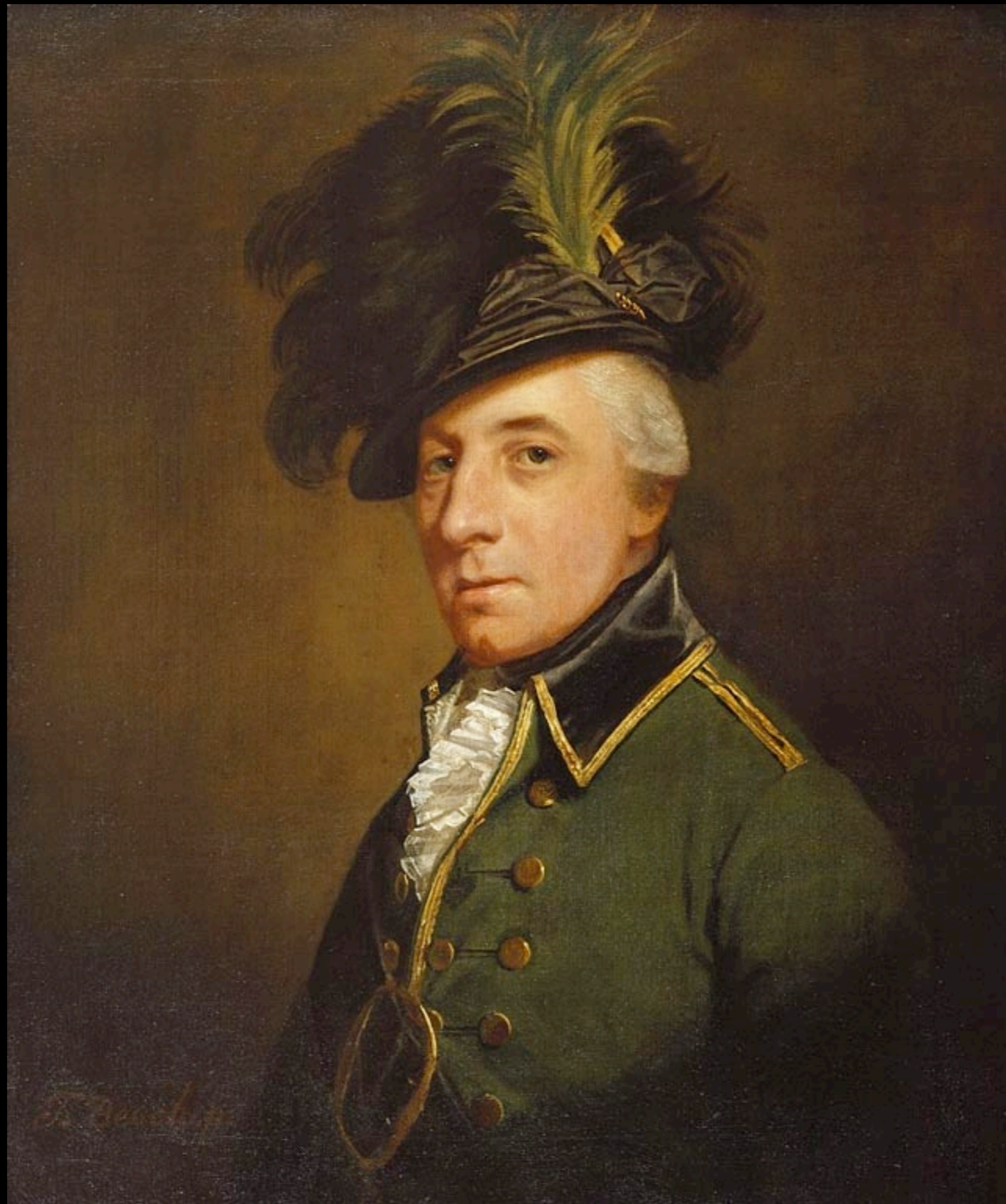
Colonel George Hanger, 4th Barone Coleraine of the British Legion by Thomas Beach c. 1782 - 1785 (The Royal Museum)