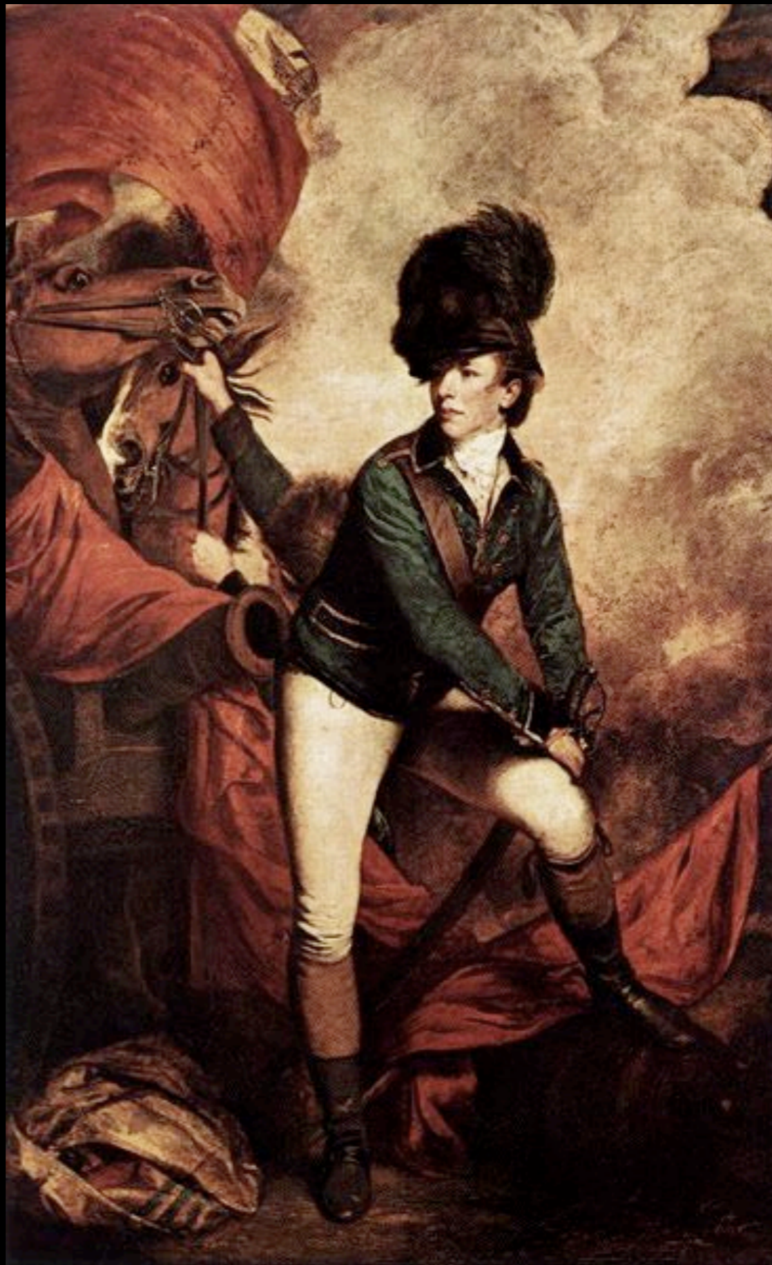
Lieutenant Colonel Banastre Tarleton of the British Legion by Sir Joshua Reynolds c. 1782