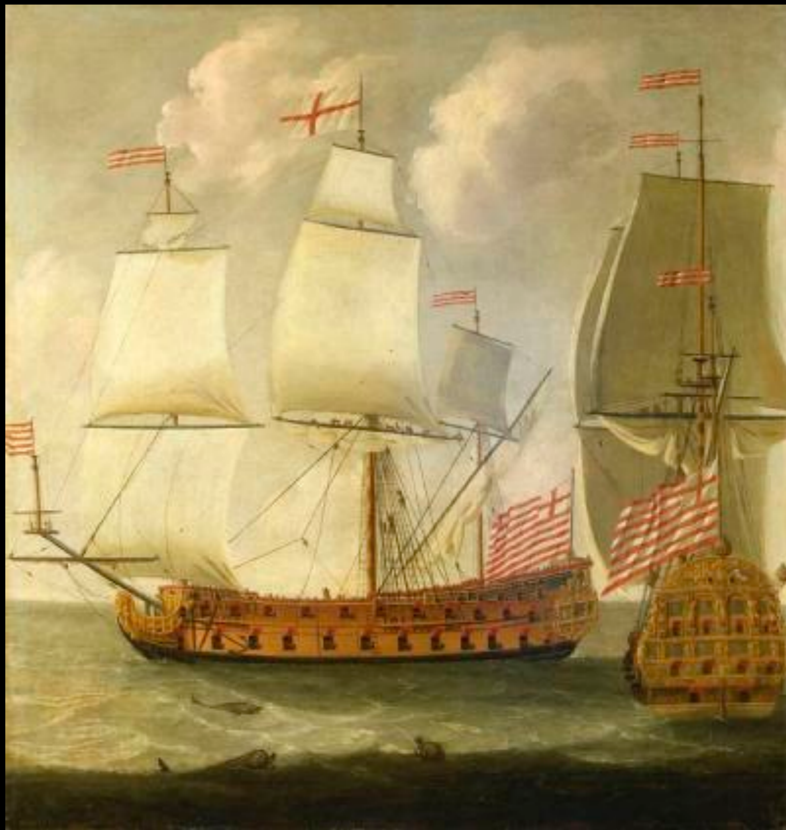
British East India Company flag from Flag Chart published by B. Lens c. 1700 & Ships 1685