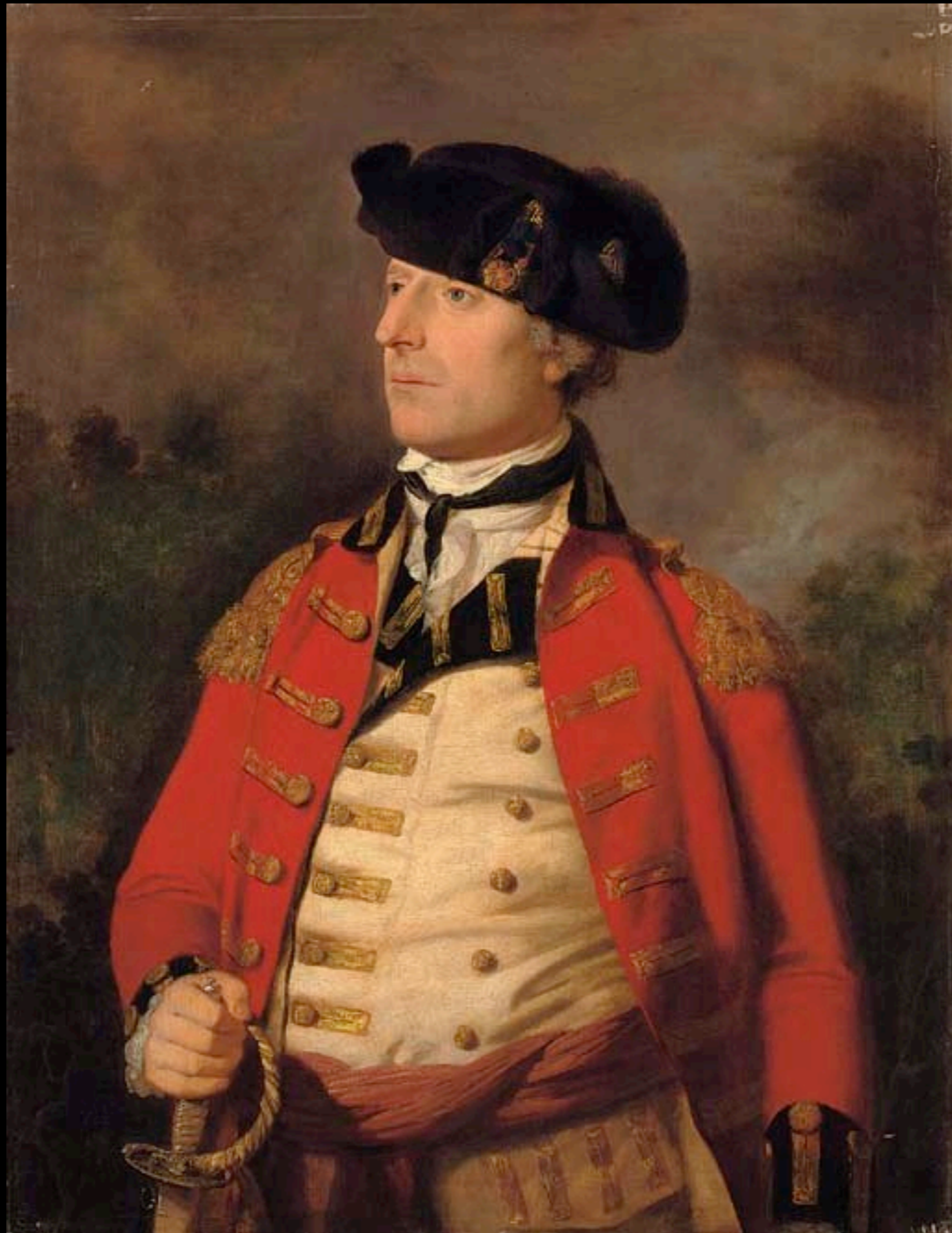
A Staff Officer of the East India Company