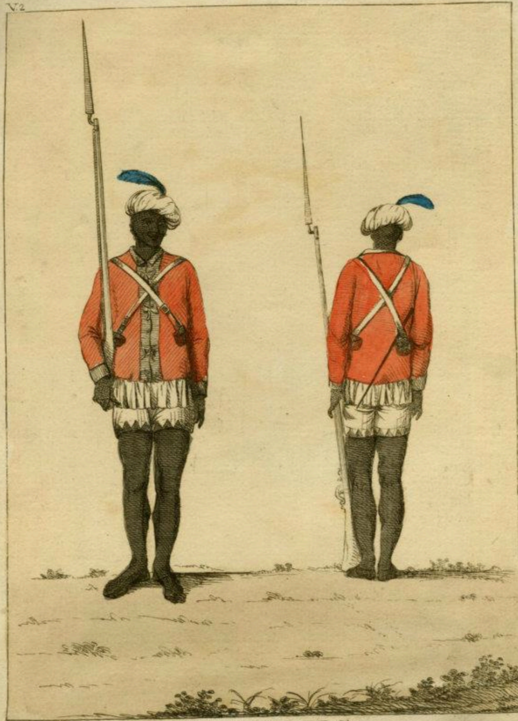
SEAPOYS. of the 3 d Battalion at Bombay Pub. Accord to Act Oct. 1773 by W. D. S. & Co.