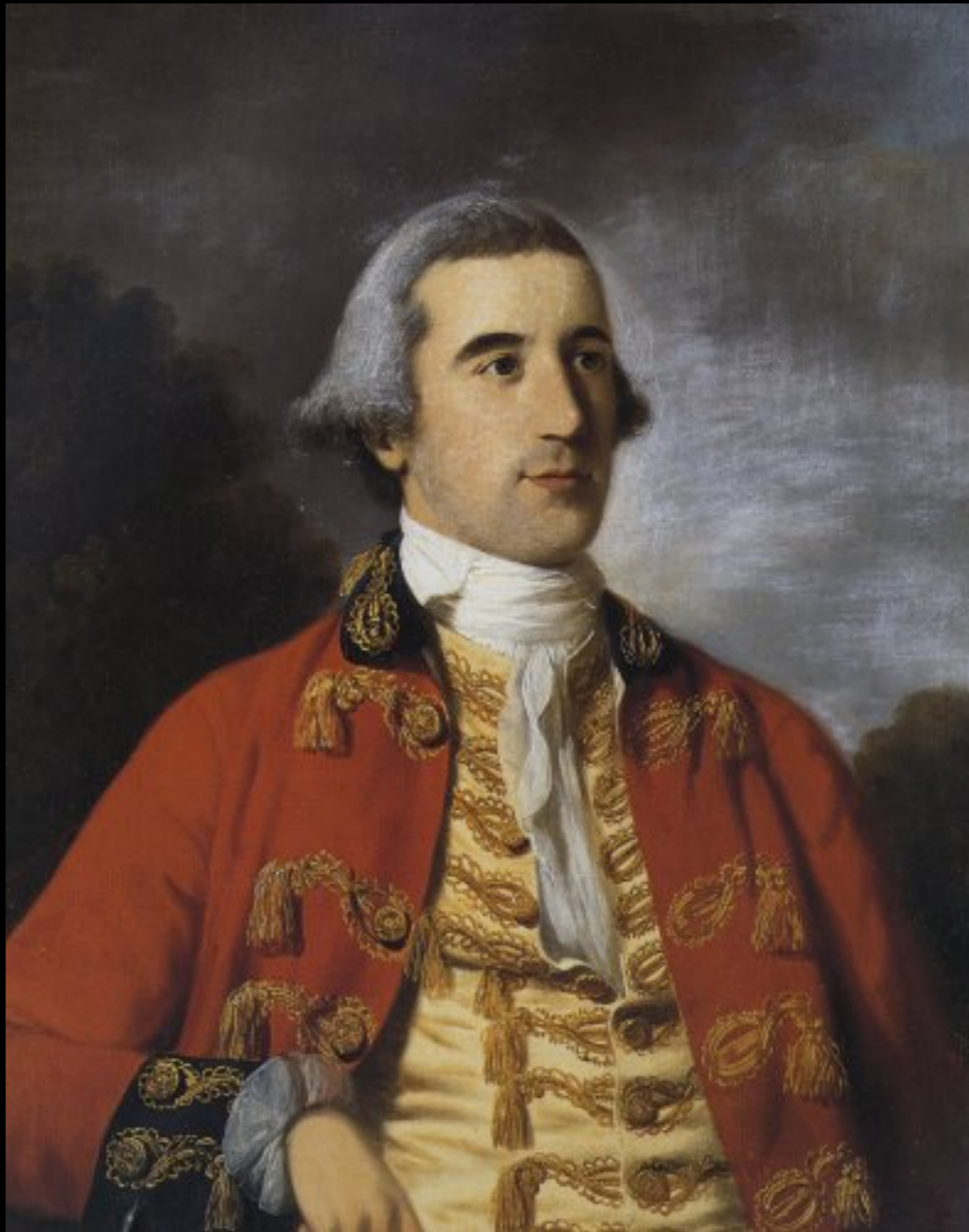
Unknown Officer of the East India Company