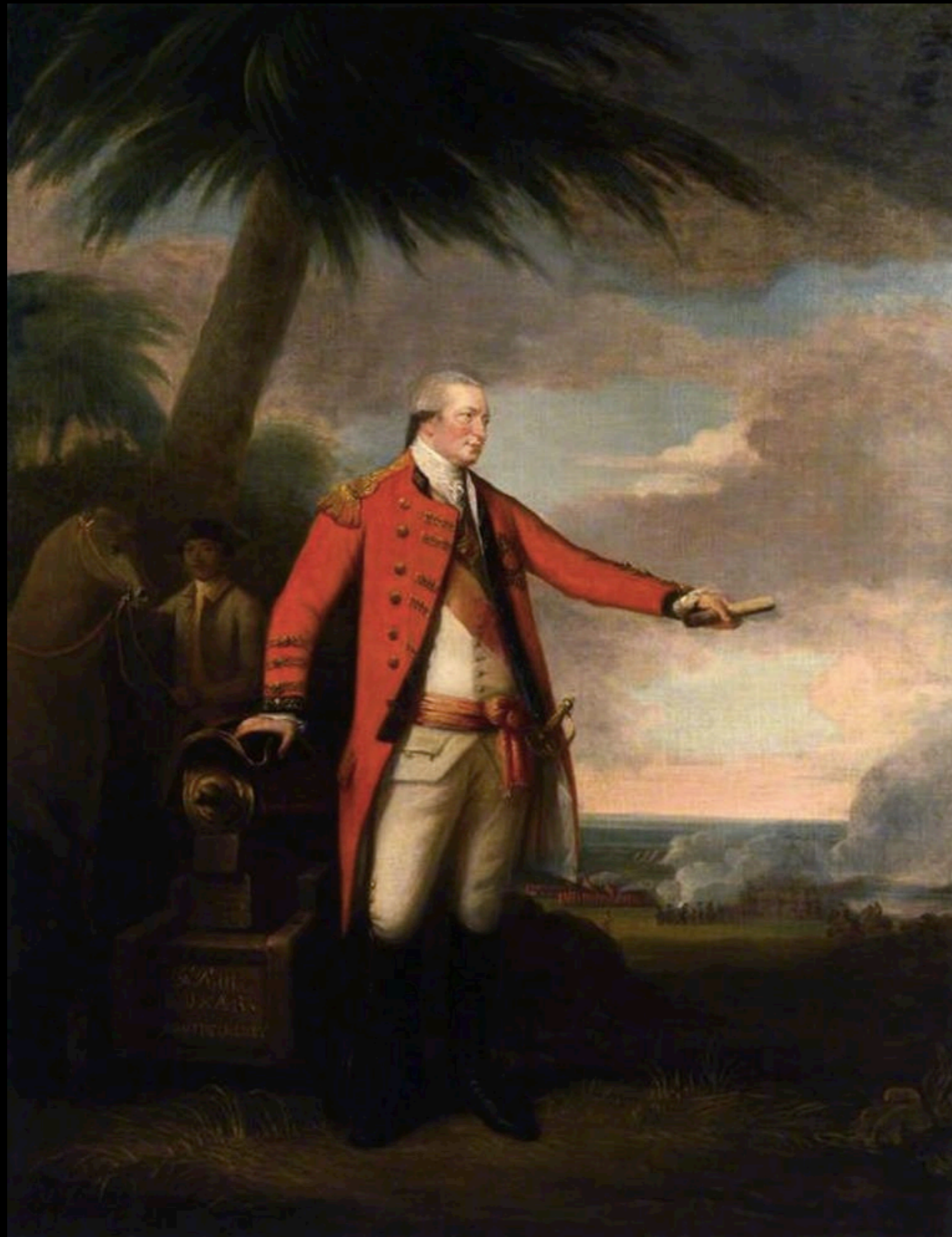
Sir Hector Munro by David Martin c. 1785