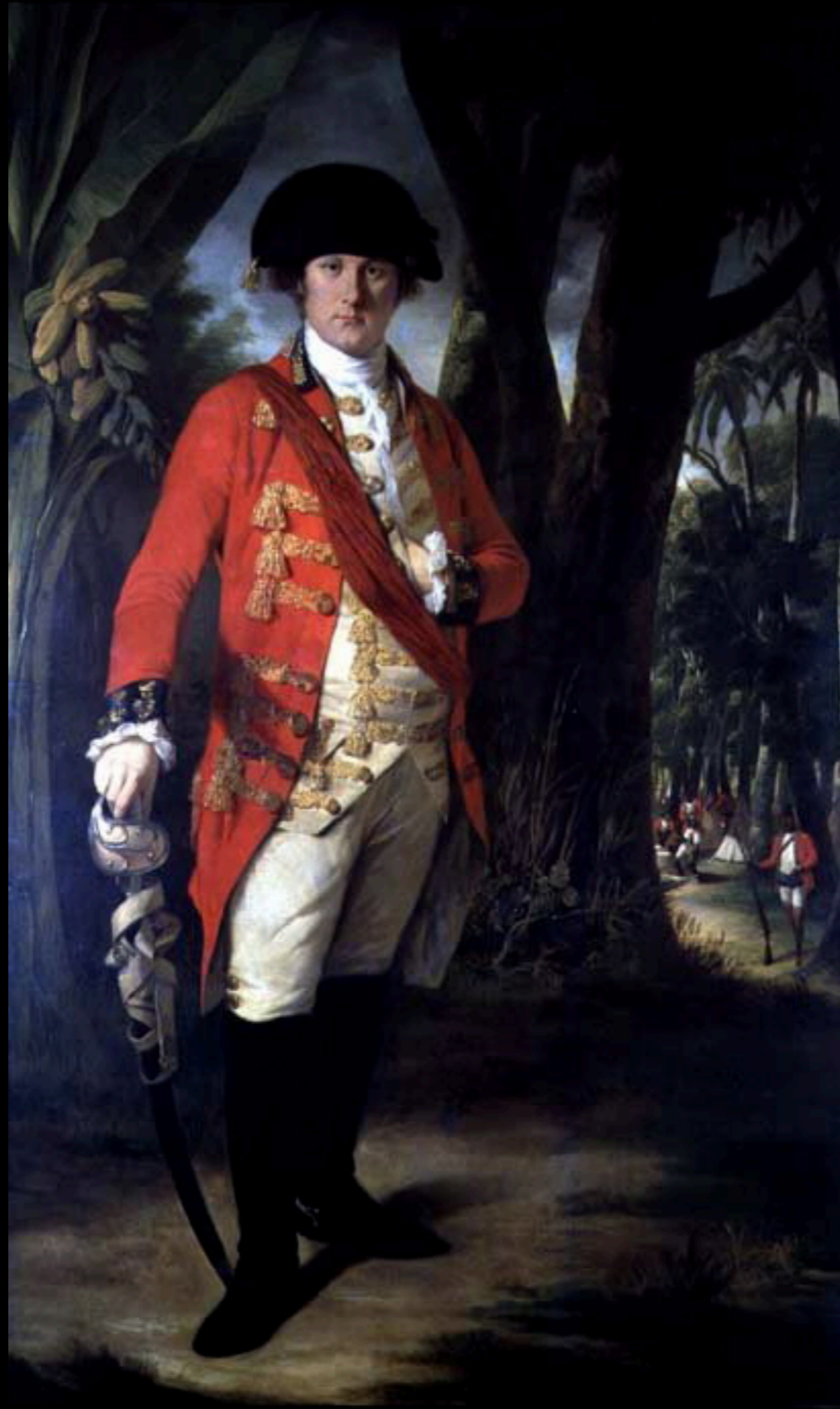
An Unknown Officer of the East India Company by Tilly Kettle c. 1770