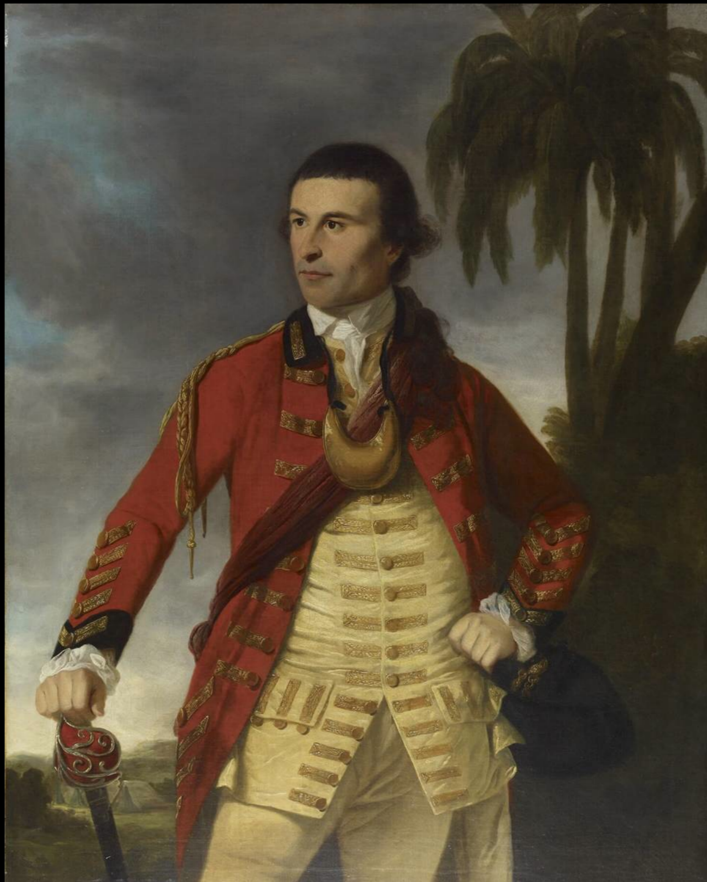
Infantry Officer, Bengal Army by Tilley Kettle 1773