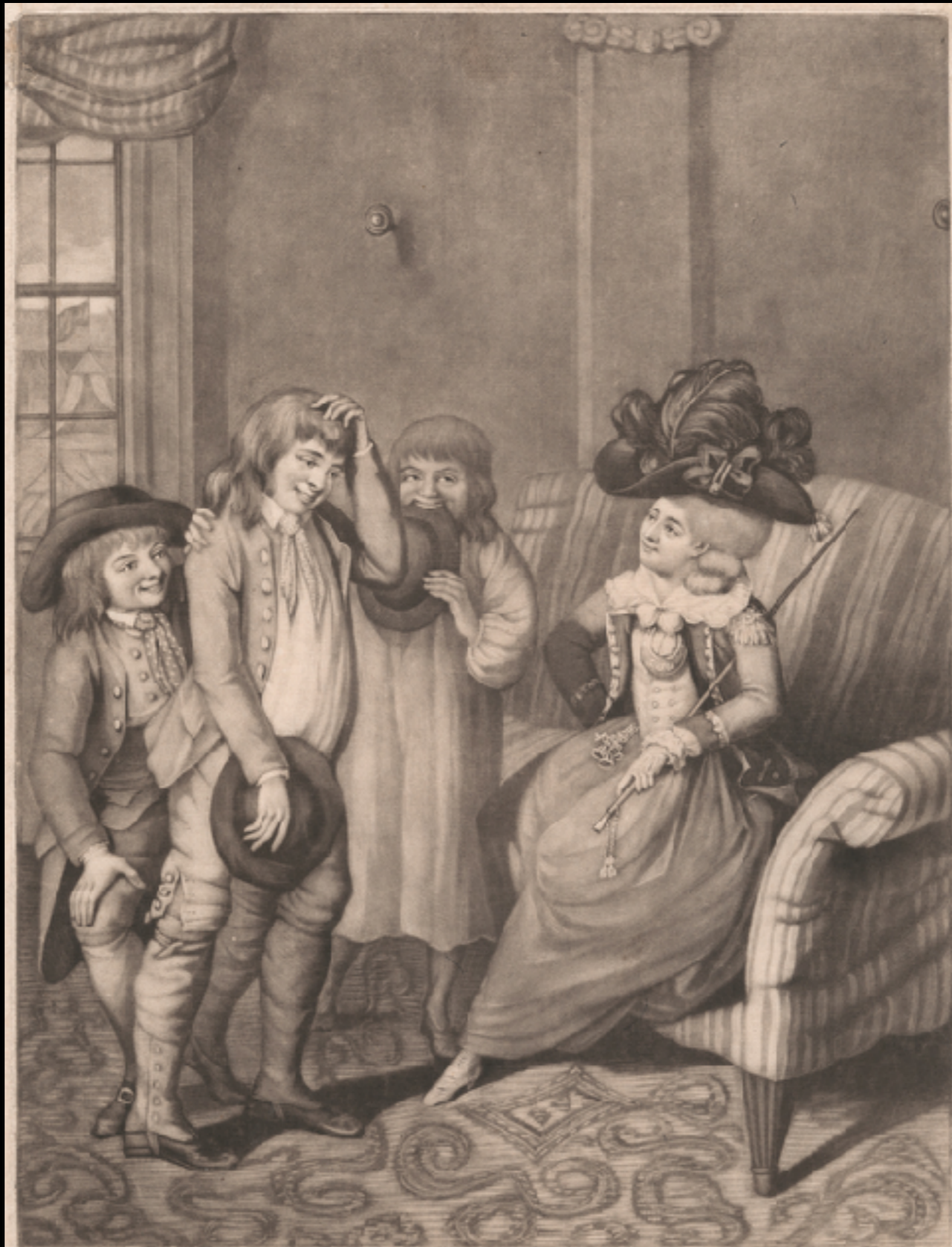
LADY GORGET raising RECRUITS for COX-HEATH.