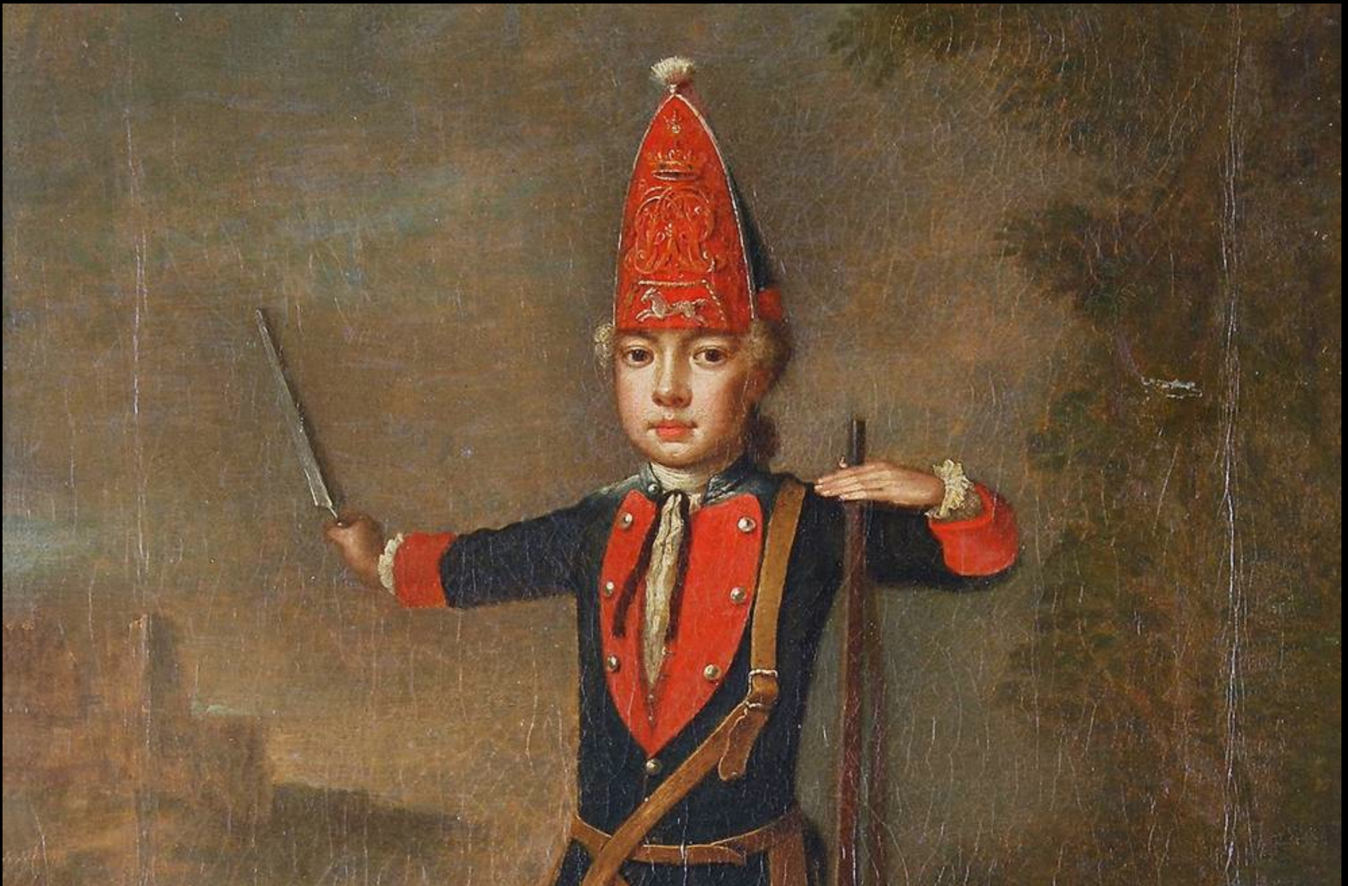
Young Boy in the Dress of the "Boy's Regiment" / "Boy's Company" - Possibly Prince George William Frederick by a Follower of Edward Haytley c. 1746 - 1750