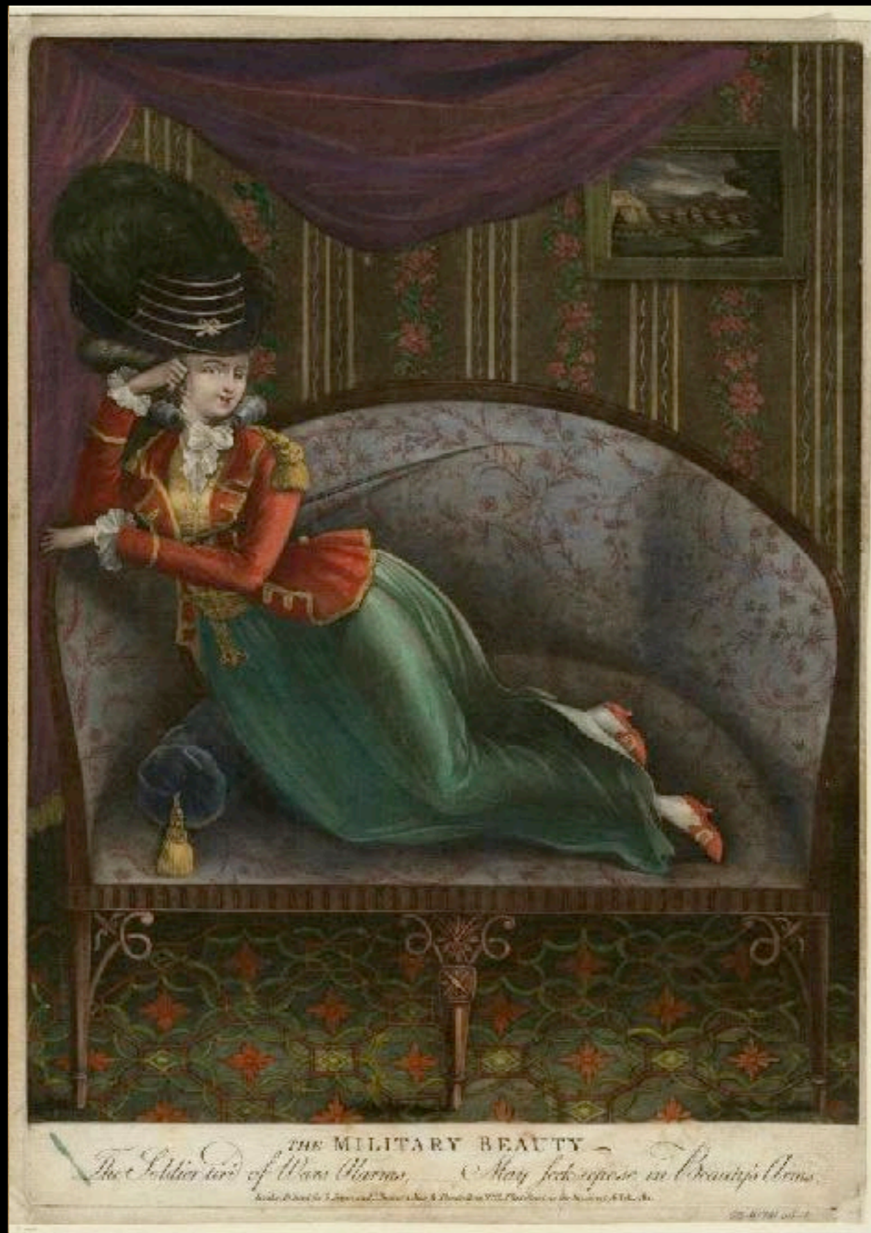
“The MILITARY BEAUTY” by Sayer & Bennett, London 1781 (The British Museum)