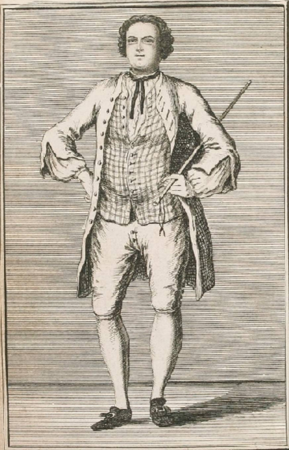
HANNAH SNELL, (the Female Soldier) Who went by the Name of James Gray.