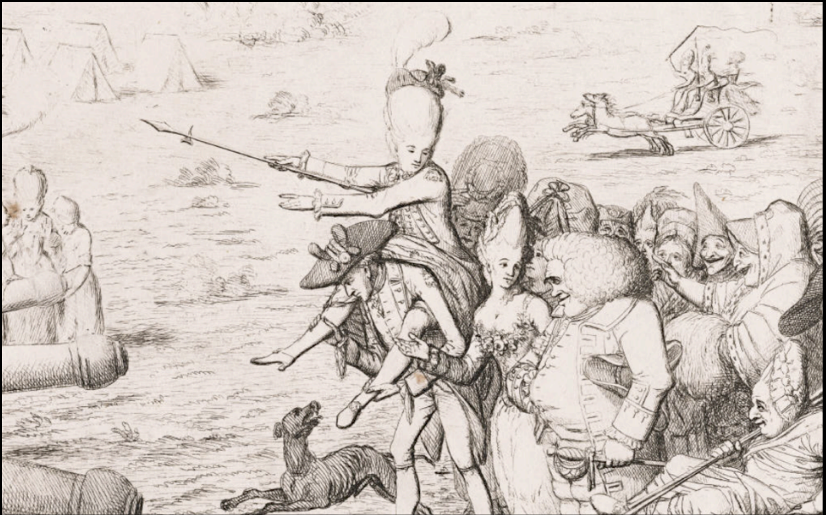
“A TRIP TO COCKS HEATH” by William Humphrey 1778