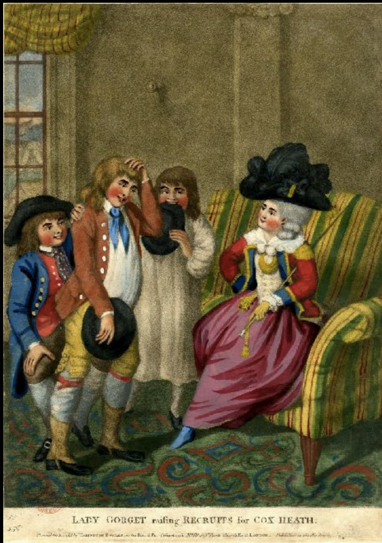
“LADY GORGET raising RECRUITS for COX-HEATH” by Carington Bowles after Robert Dighton 1781 (The British Museum)