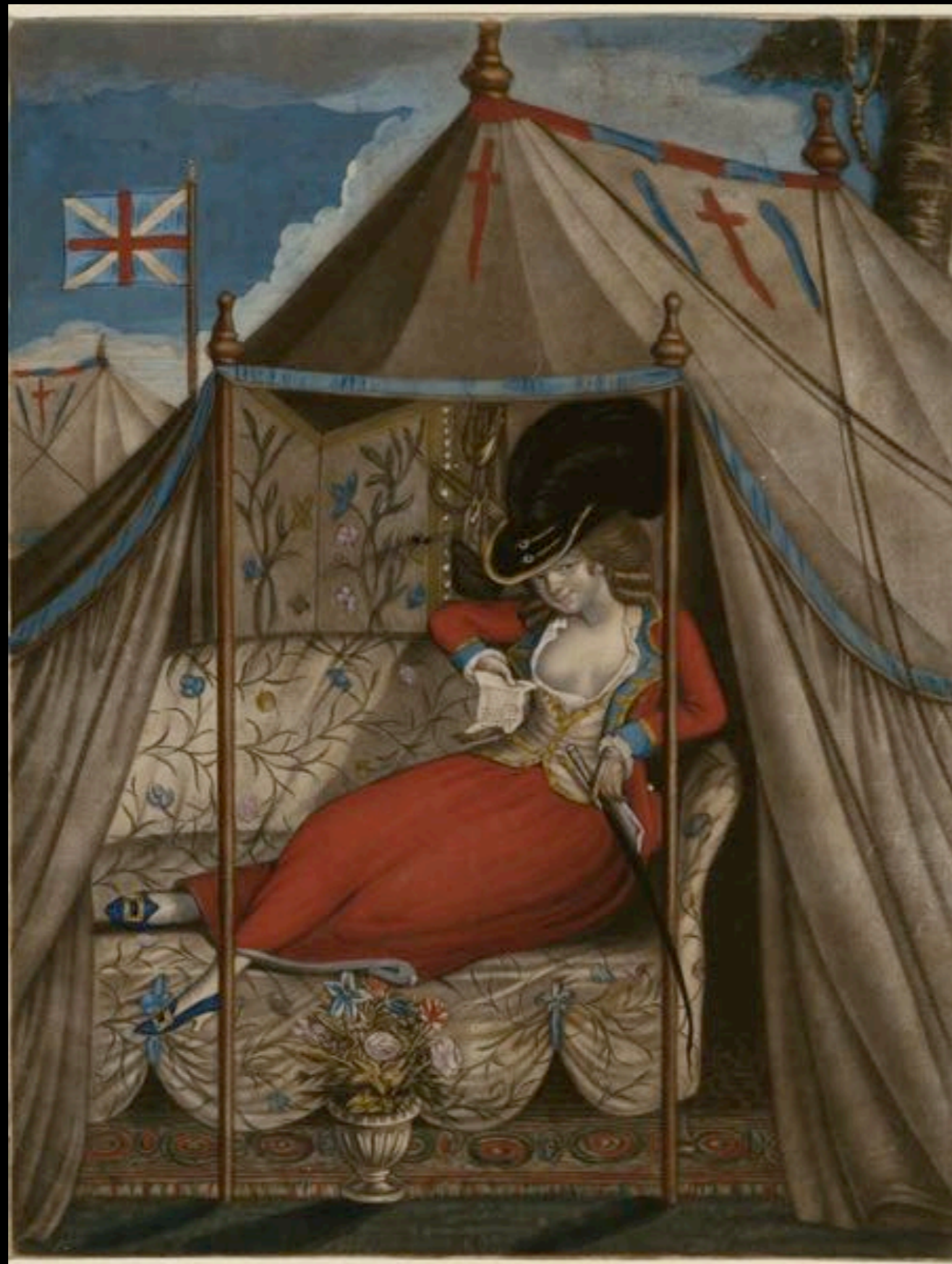
"MILITARY MAN-TRAP."