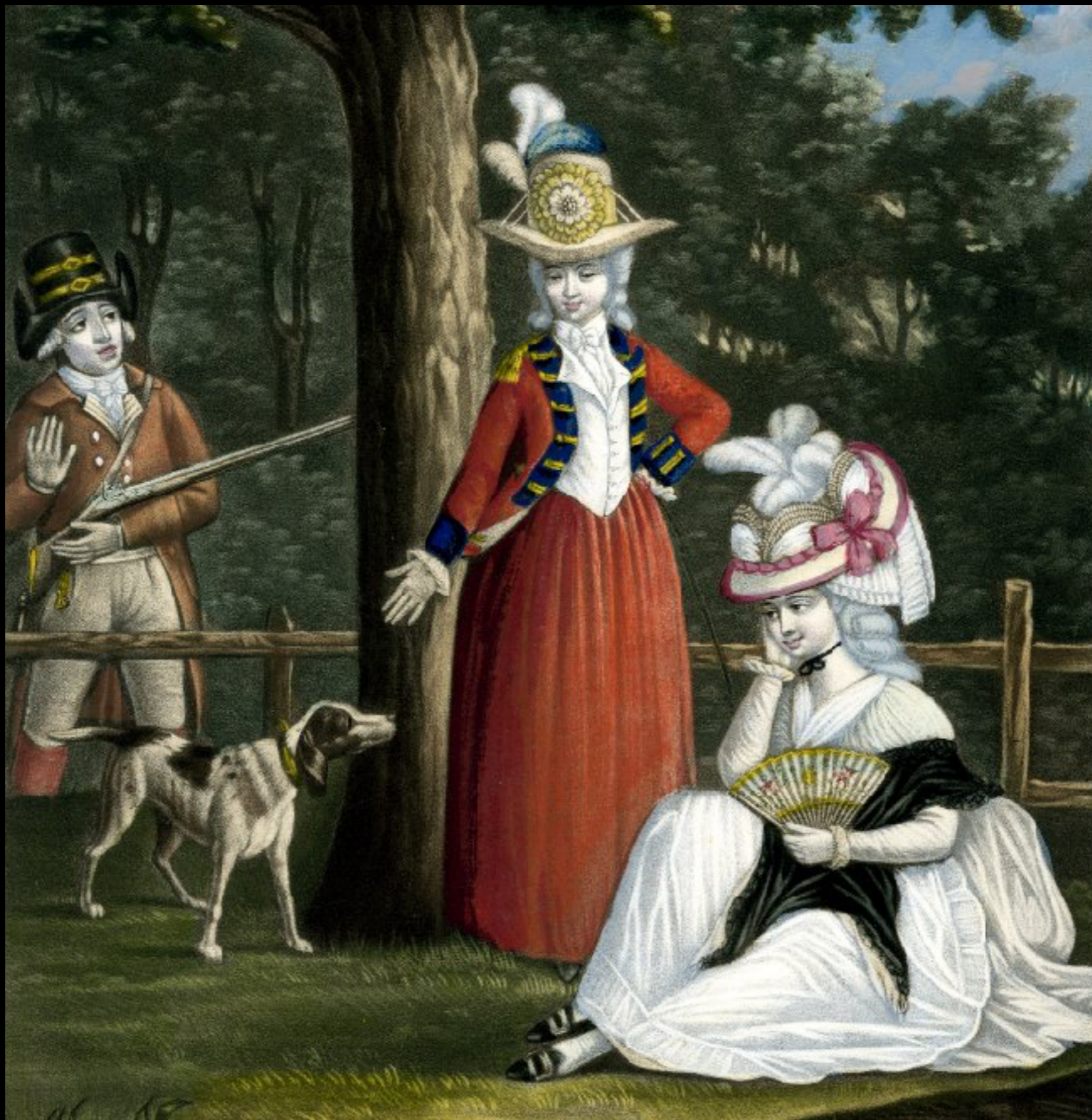
“STARTING OF GAME” by Sayer & Bennett c. 1782 (The British Museum)