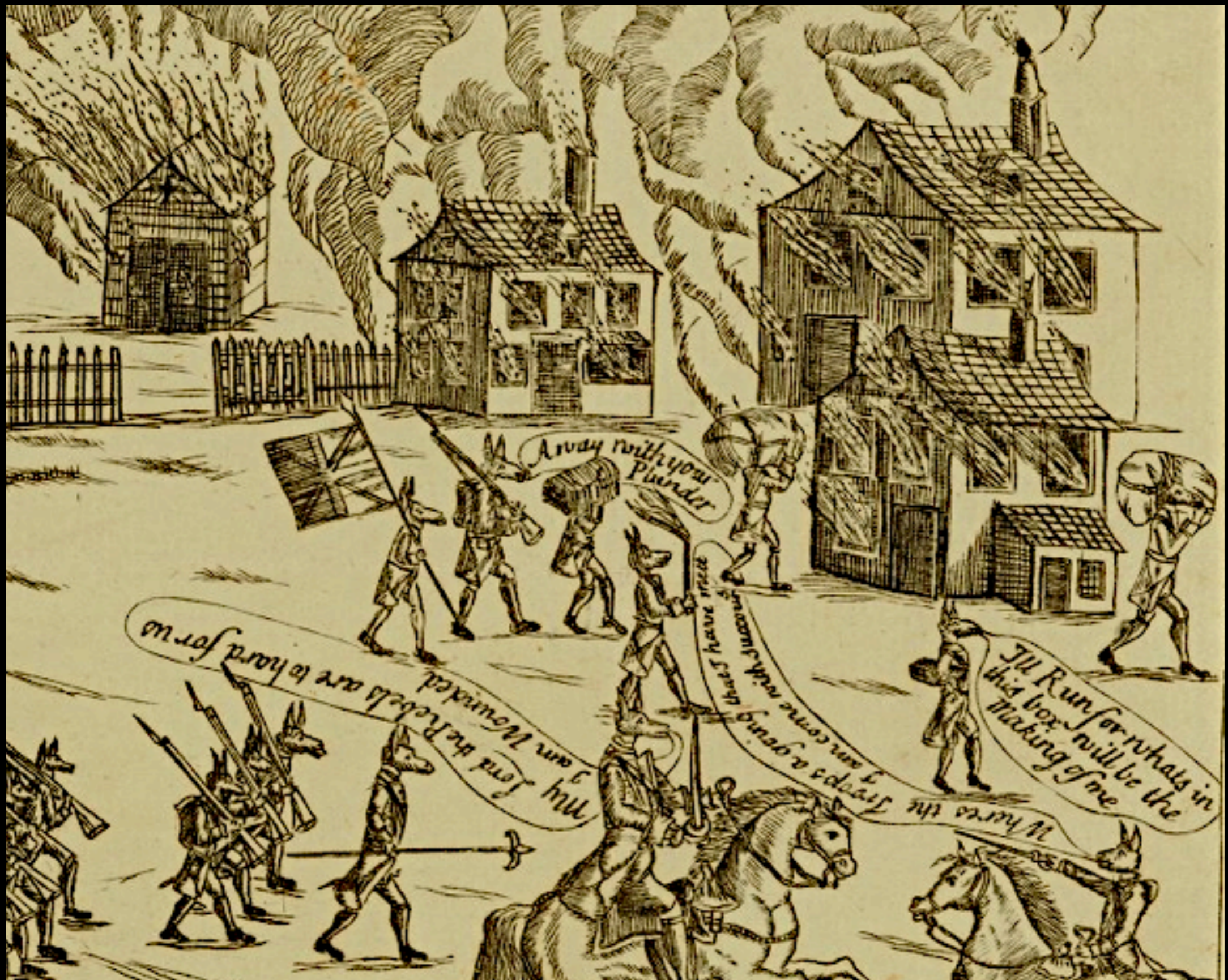
"The Retreat From Concord to Lexington of the Army of Wild Irish Asses Defeated by the Brave American Militia" London, June 19, 1775