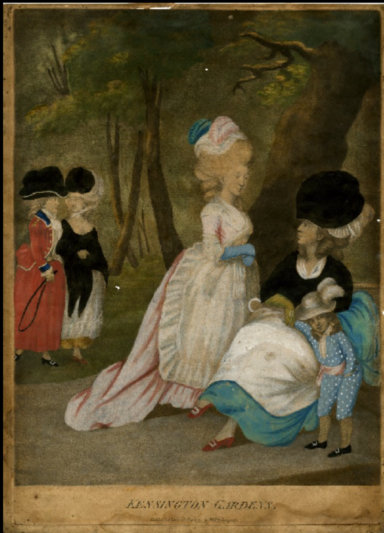
"KENSINGTON GARDENS." by William Humphrey 1779 (The British Museum)