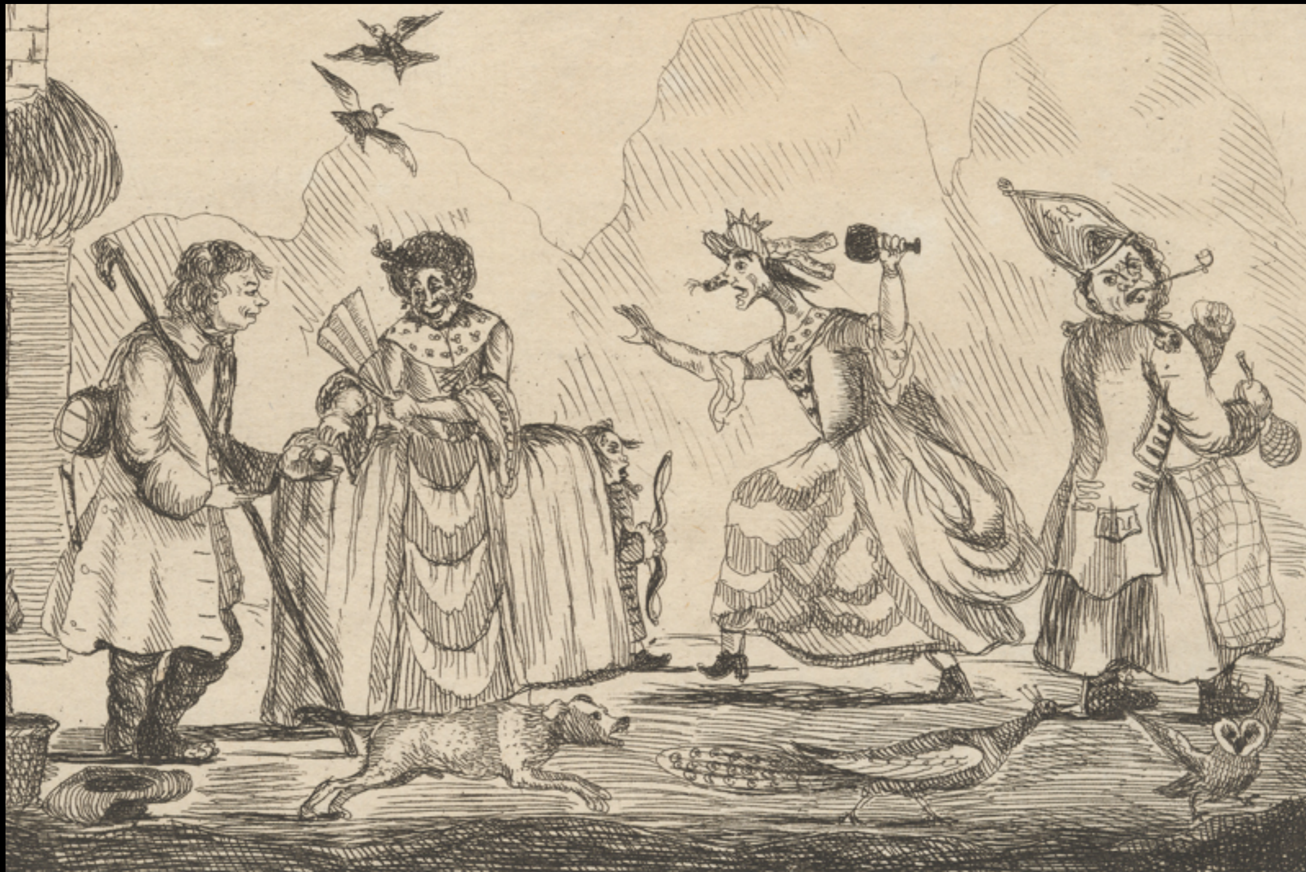
"The Judgement of Paris" by William Bunbury 1771 (Yale Center for British Art)