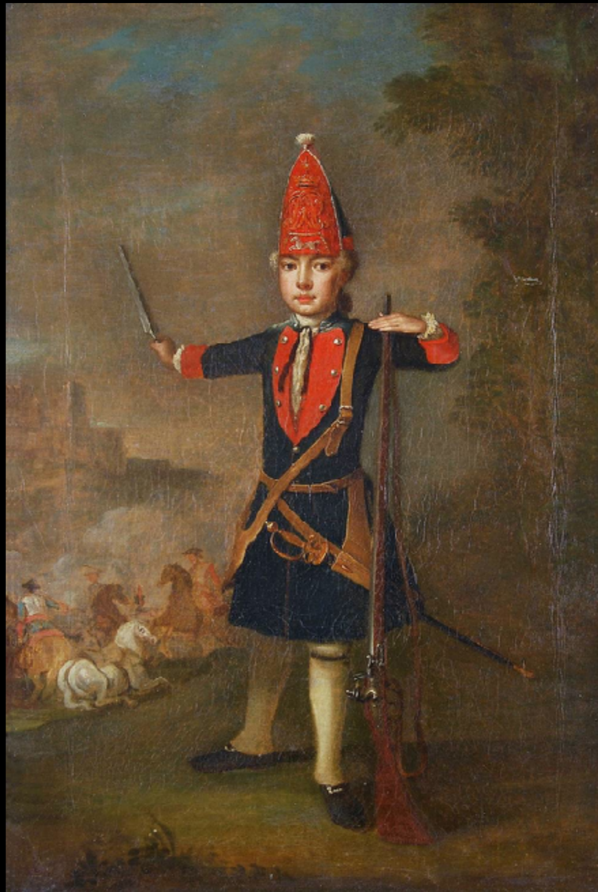
Young Boy in the Dress of the "Boy's Regiment" / "Boy's Company" - Possibly Prince George William Frederick by a Follower of Edward Haytley c. 1746 - 1750