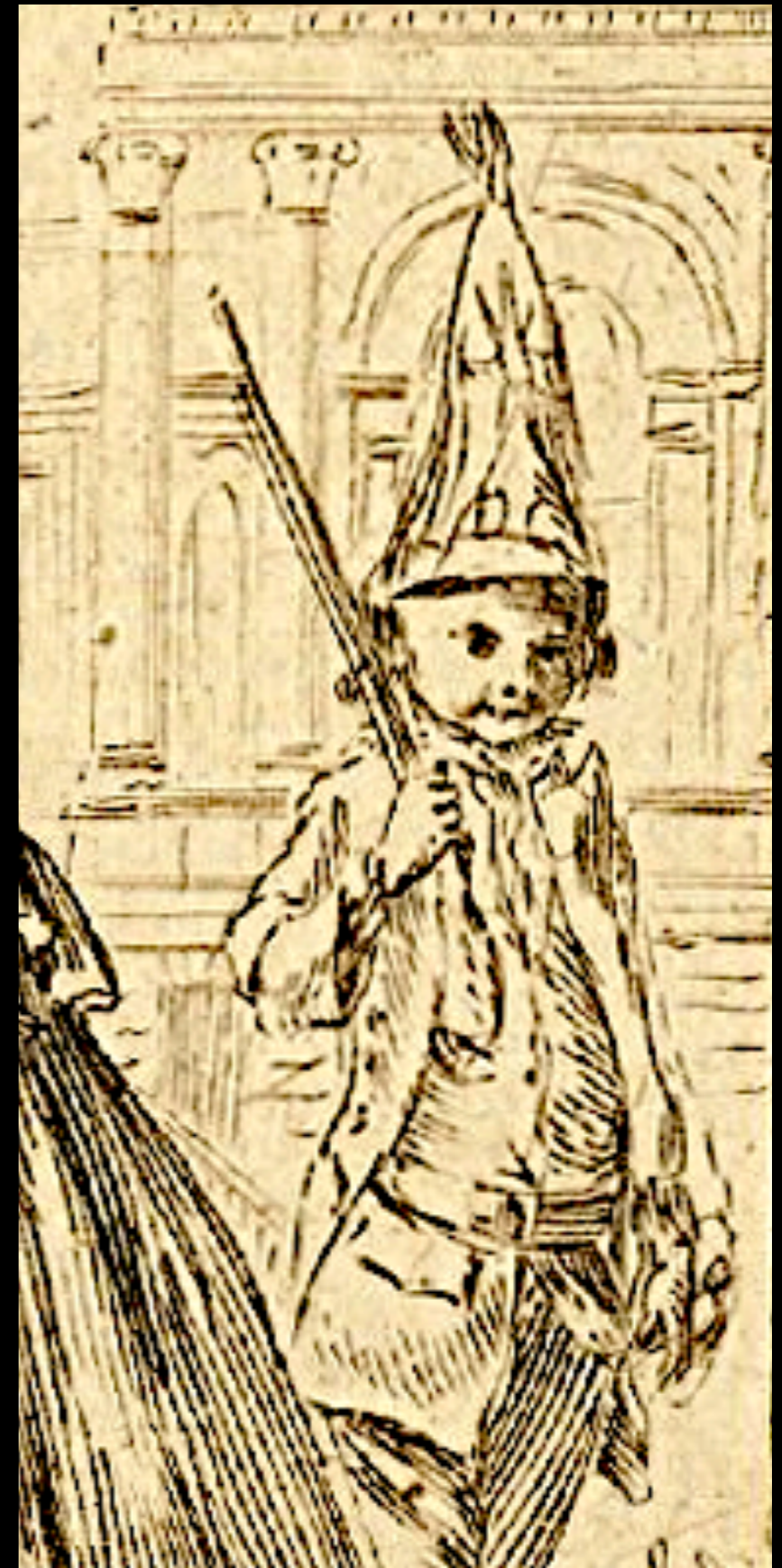
Figure Study by Paul Sandby c. 1756 (The British Museum)