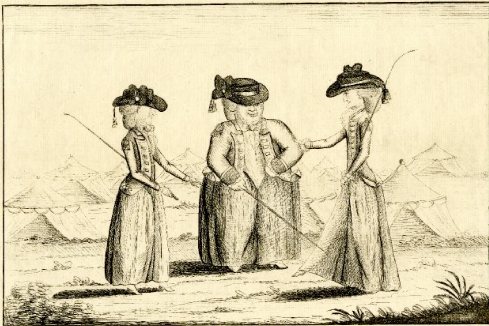
THE THREE GRACES OF COX-HEATH.