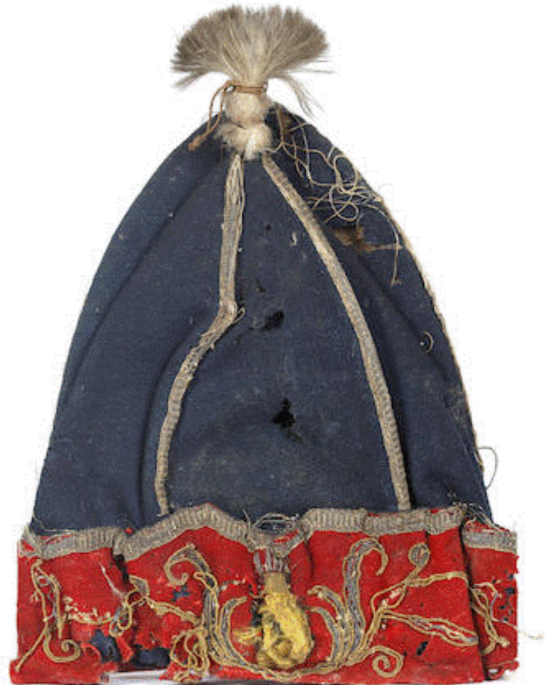
Grenadier Cap of the "Boy's Regiment" / "Boy's Company" c. 1746 - 1750 (Museum of London)