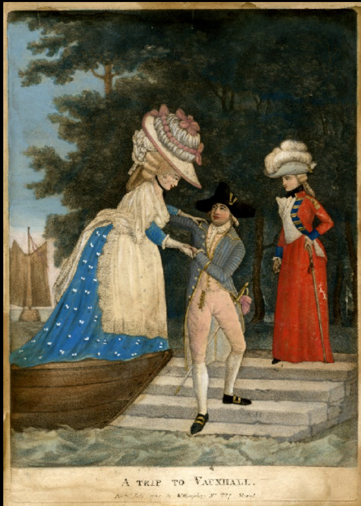
"A TRIP TO VAUXHALL" by William Humphrey 1782 (The British Museum)