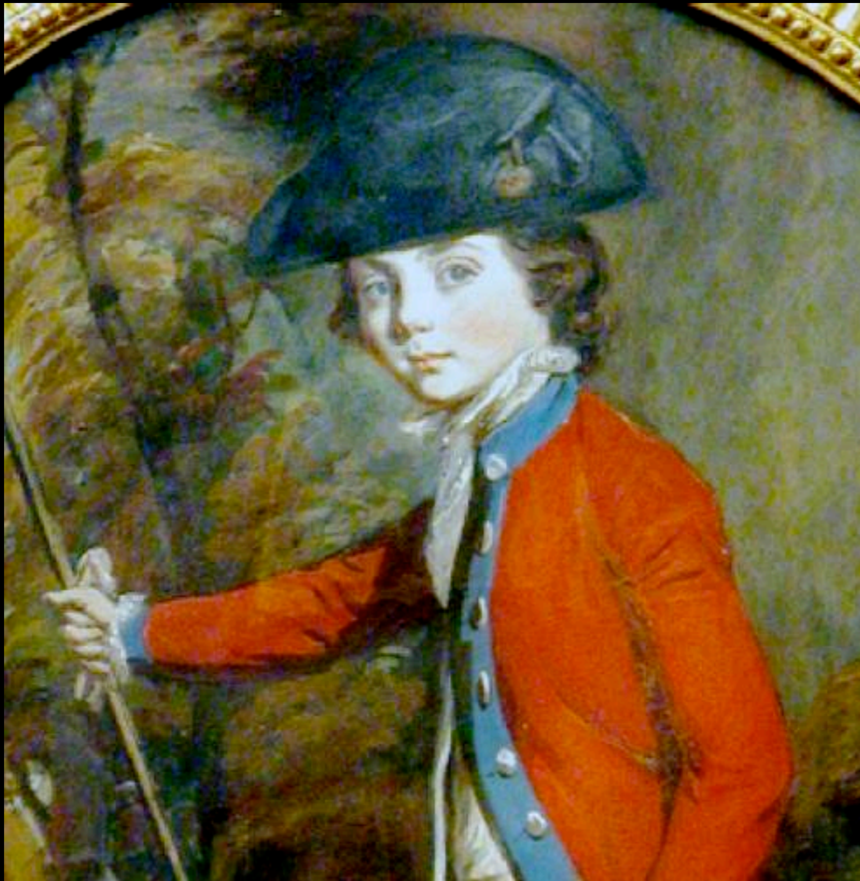
John Parker, First Earl of Morley by Daniel Gardner c. 1779 (National Trust)