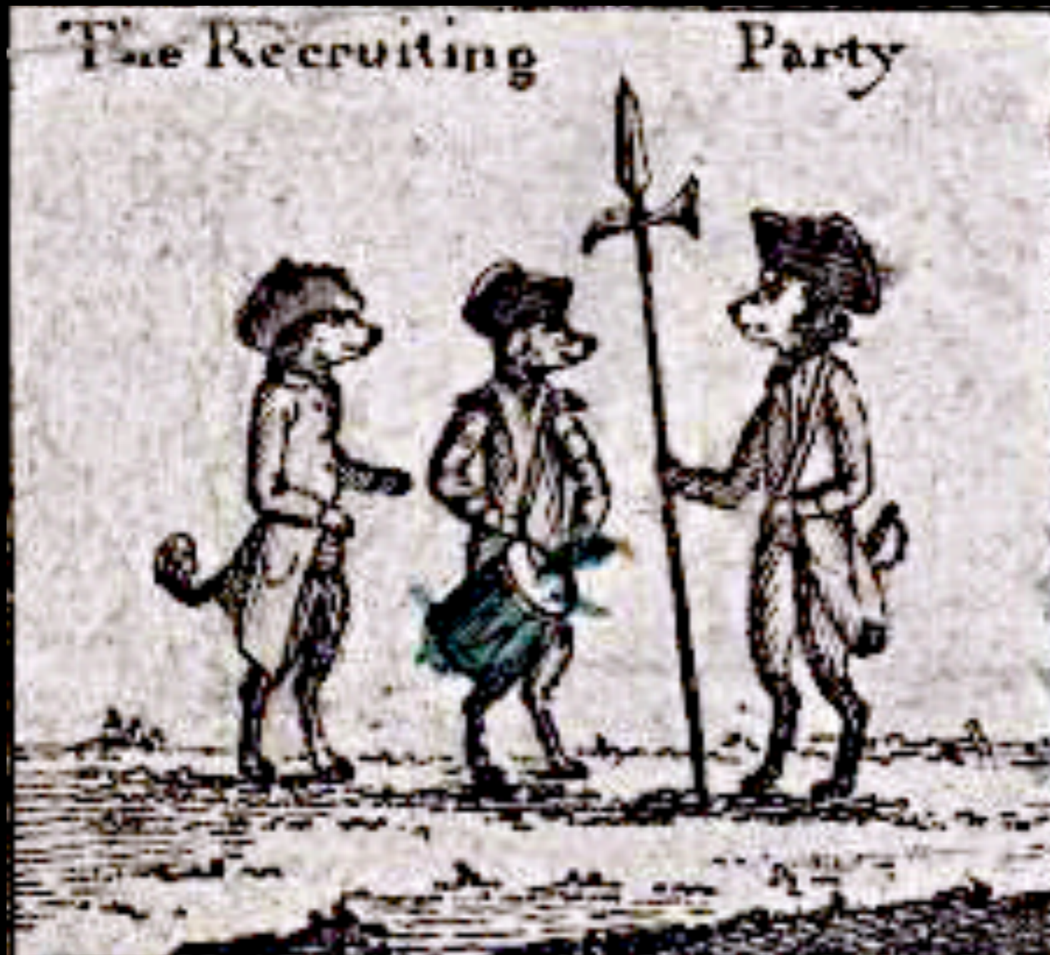
"The Exhibition of Dancing Dogs" by J. Marshall & Co. Aldermary Church Yard, London 1785 (Bodleian Library)