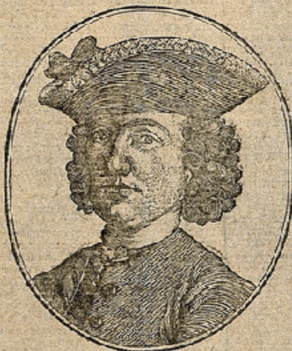
Some account of HANNAH SNELL, the Female Soldier.