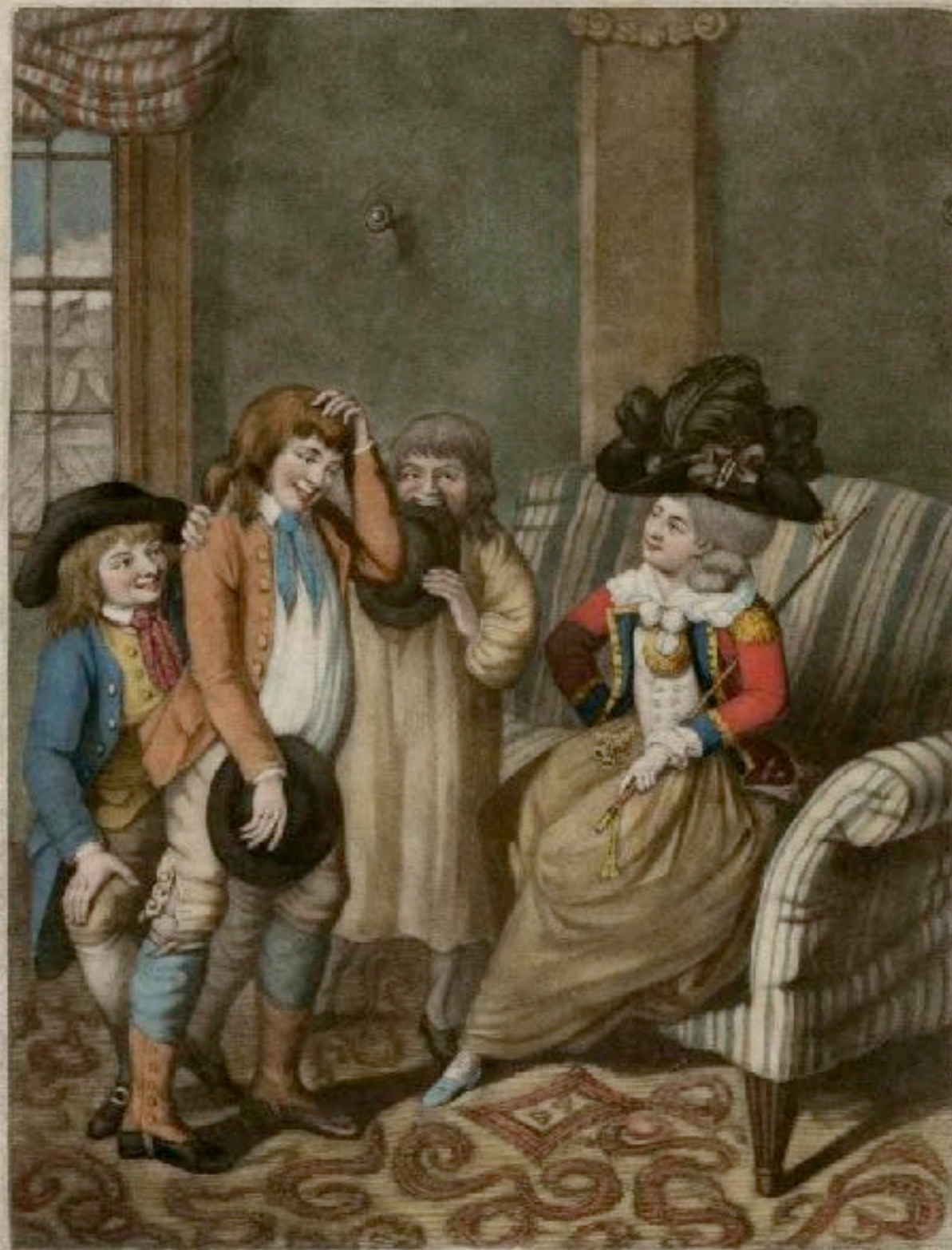
LADY GORGET raising RECRUITS for COX-HEATH.