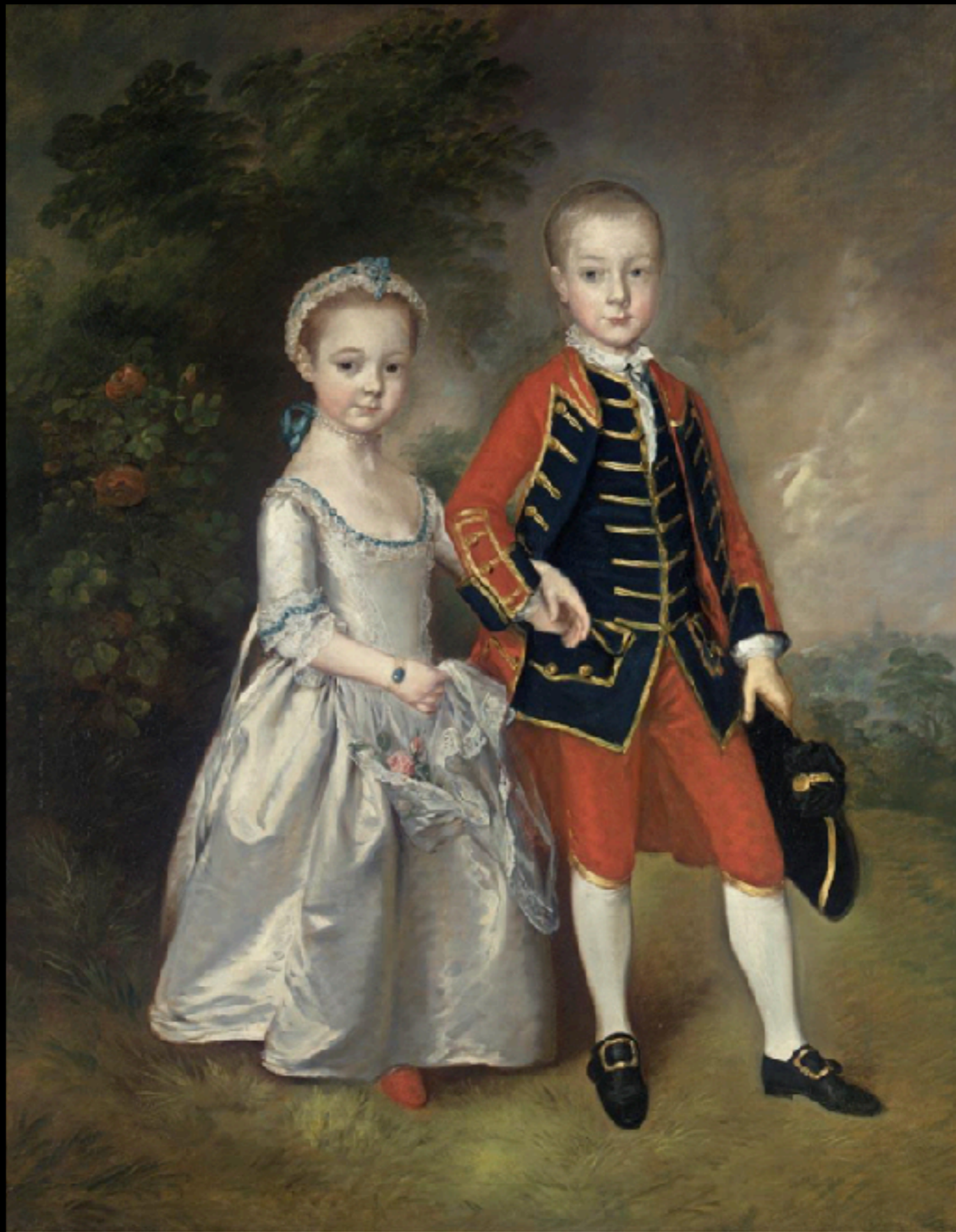
Portrait of Two Children of the Bathwurst Family by Thomas Gainsborough