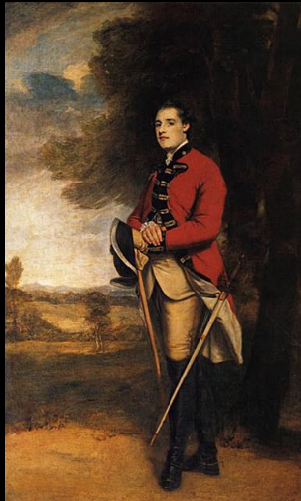
Lady & Sir Richard Worsley by Sir Joshua Reynolds c. 1775 (Earl and Countess of Harewood, Harewood House, Yorkshire, UK)