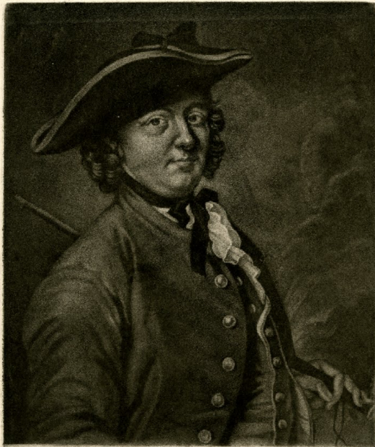
HANNAH SNELL, born at WORCESTER 1723. Approved by the Trustees of the Society for the Propagation of the Gospel in Foreign Parts