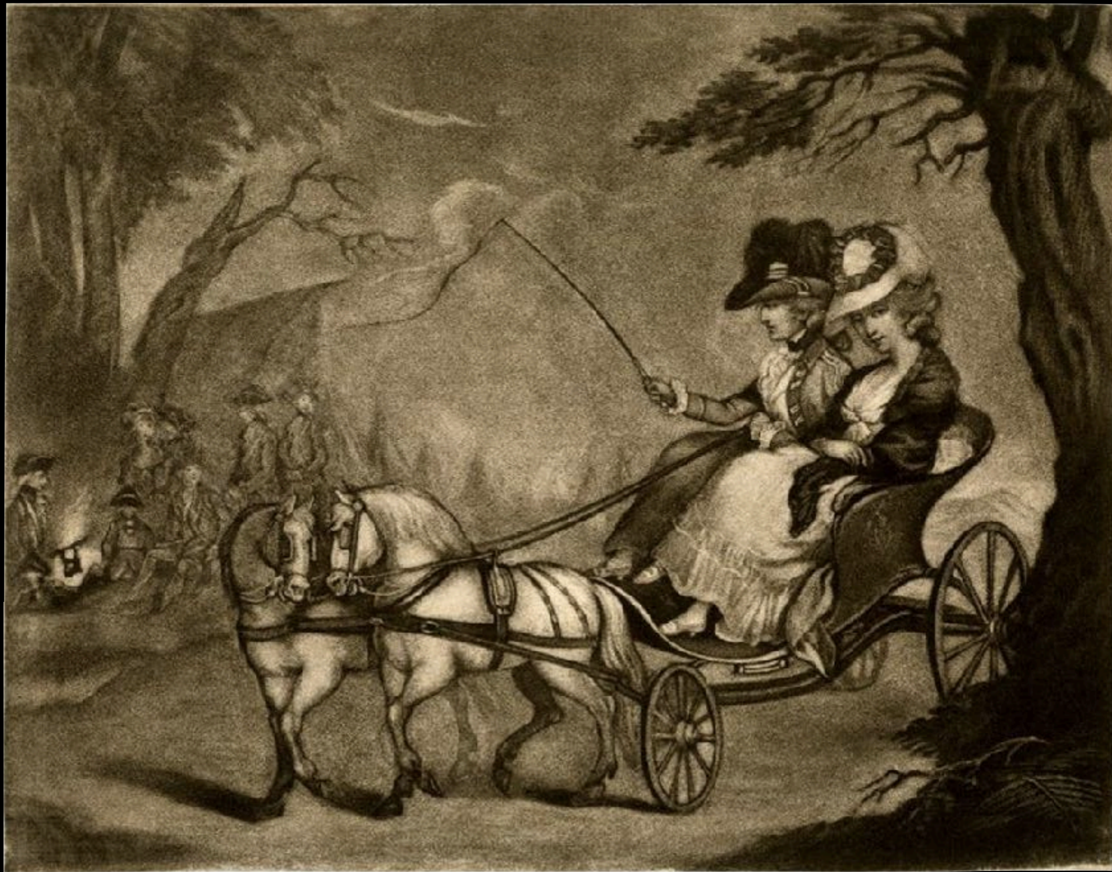
“A Trip to Blackheath” by Anonymous 1780 (The British Museum)