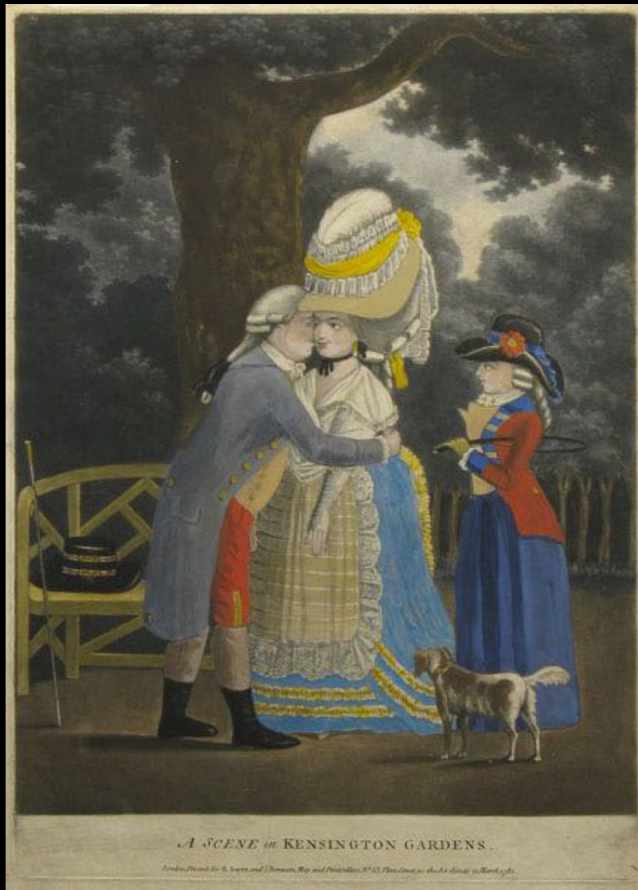
A SCENE in KENSINGTON GARDENS.