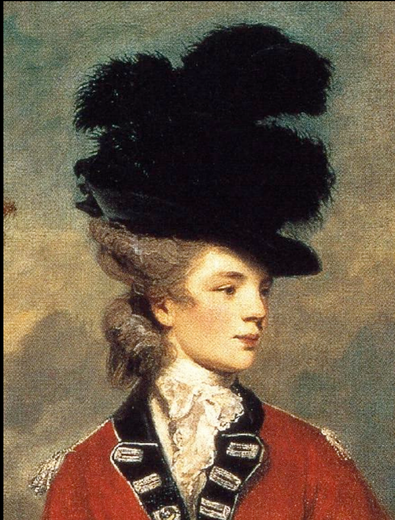
Lady Worsley by Sir Joshua Reynolds c. 1775 (Earl and Countess of Harewood, Harewood House, Yorkshire, UK)