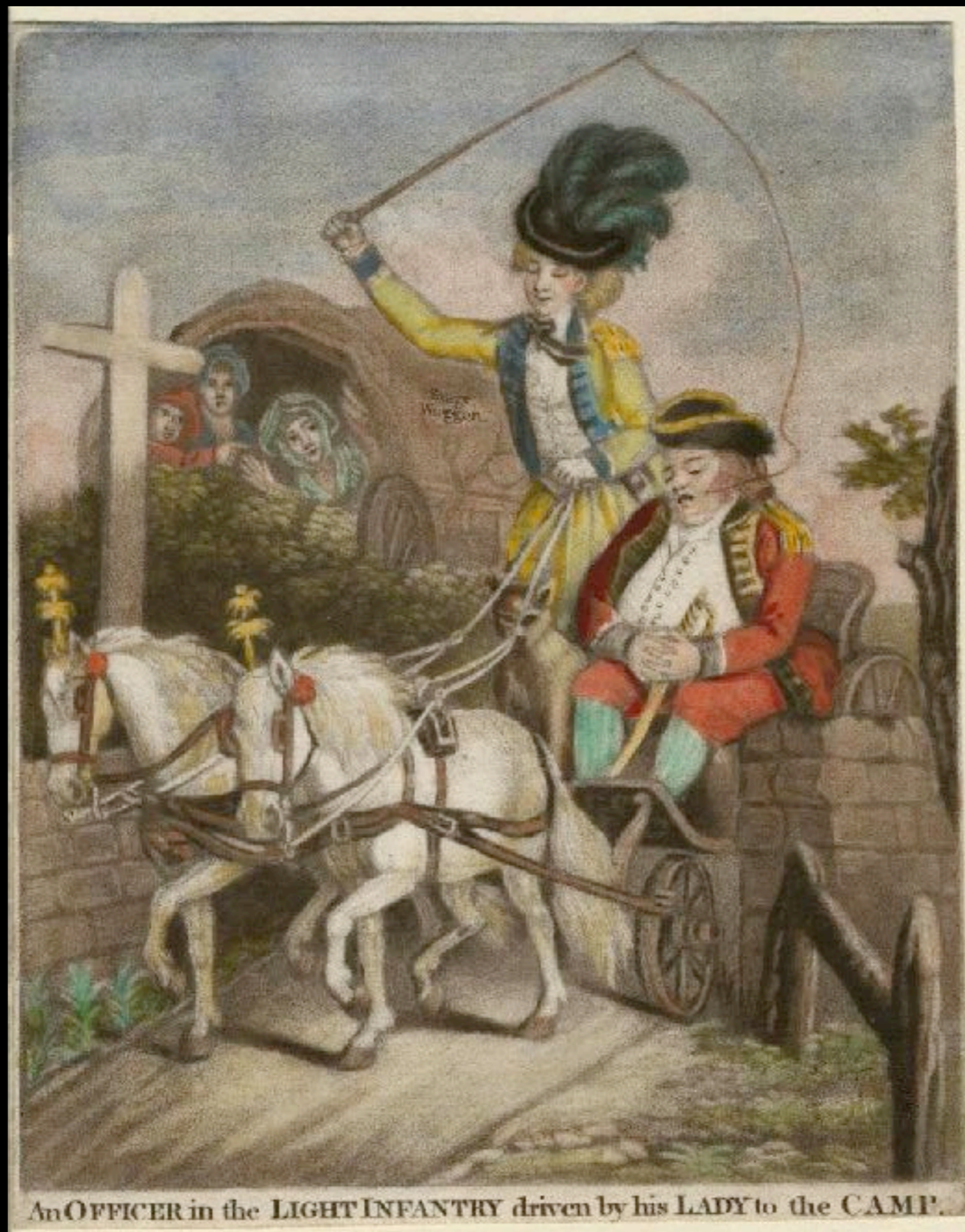
An OFFICER in the LIGHT INFANTRY driven by his LADY to the CAMP.