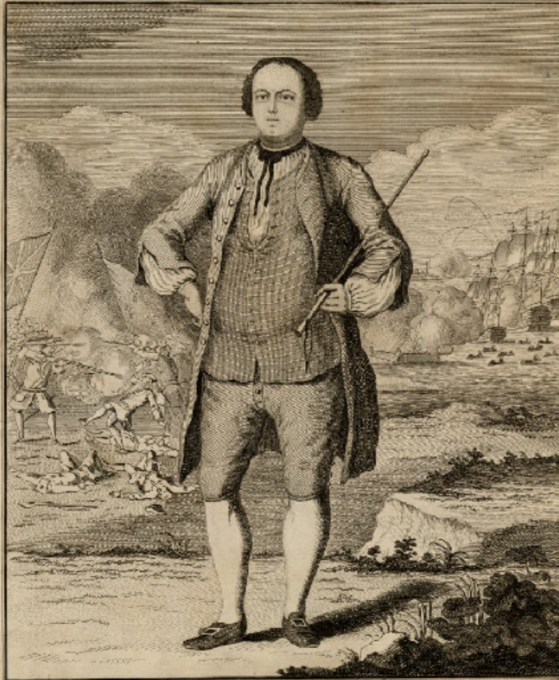
HANNAH SNELL the Female Soldier.

Drawn from the Life by her own Consent by L. P. Boitard.