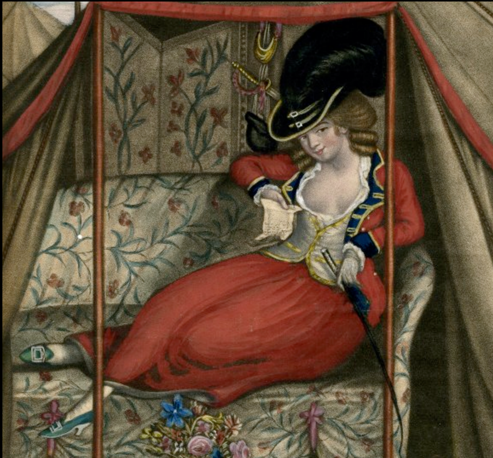
“MILITARY MAN-TRAP.” Published by Sayer & Bennett 1780