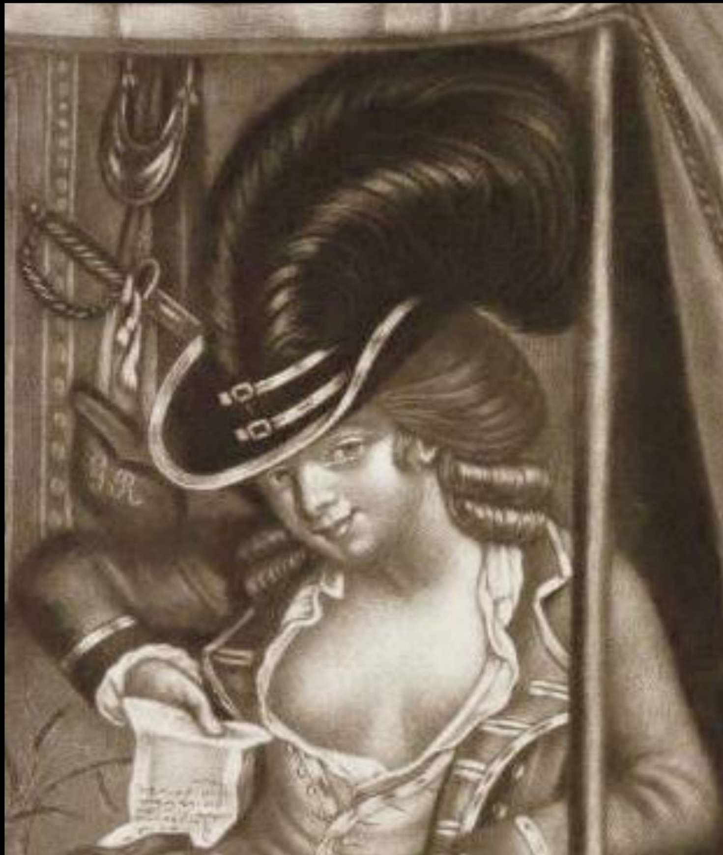
“MILITARY MAN-TRAP.”