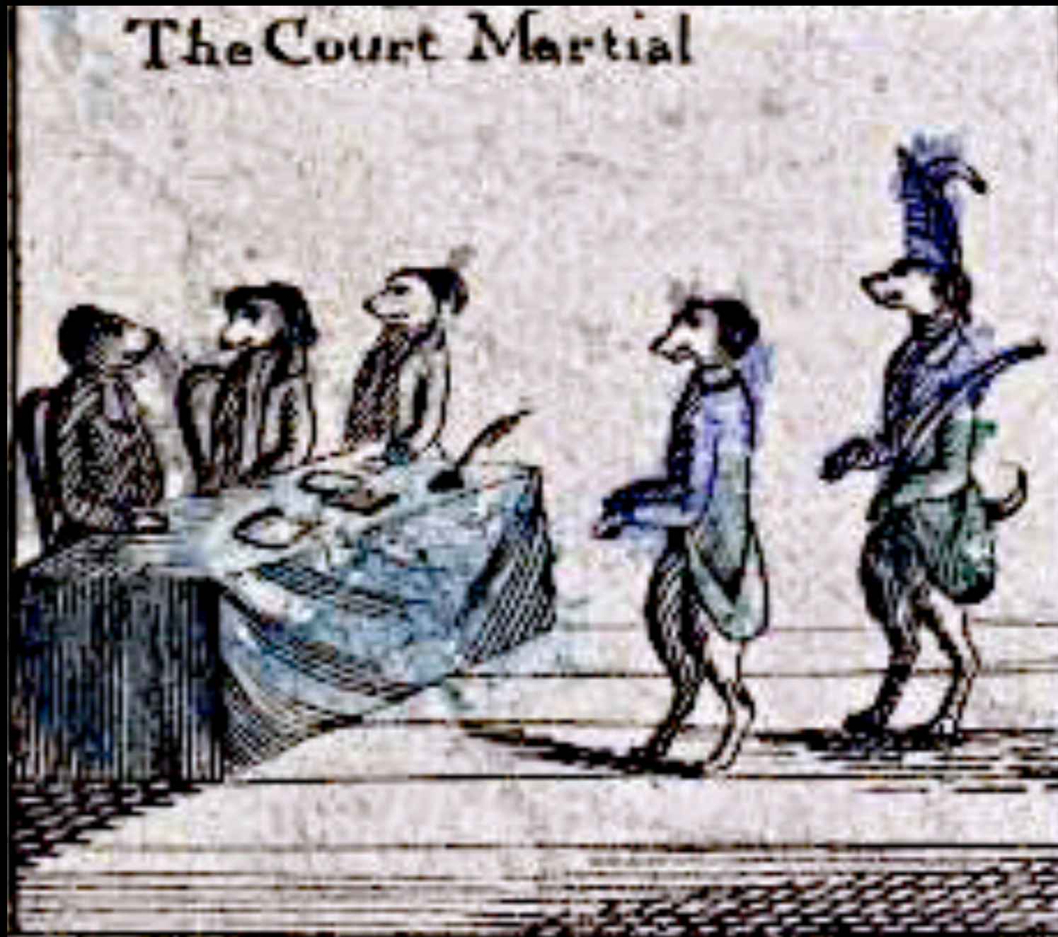
"The Exhibition of Dancing Dogs" by J. Marshall & Co. Aldermary Church Yard, London 1785