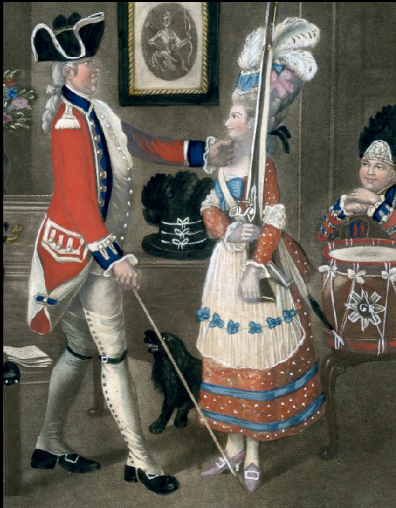
“CORPORAL CARTOUCH teaching MISS CAMP-LOVE her Manual Exercise” by Sayer & Bennett after John Collet 1780 (The British Museum)