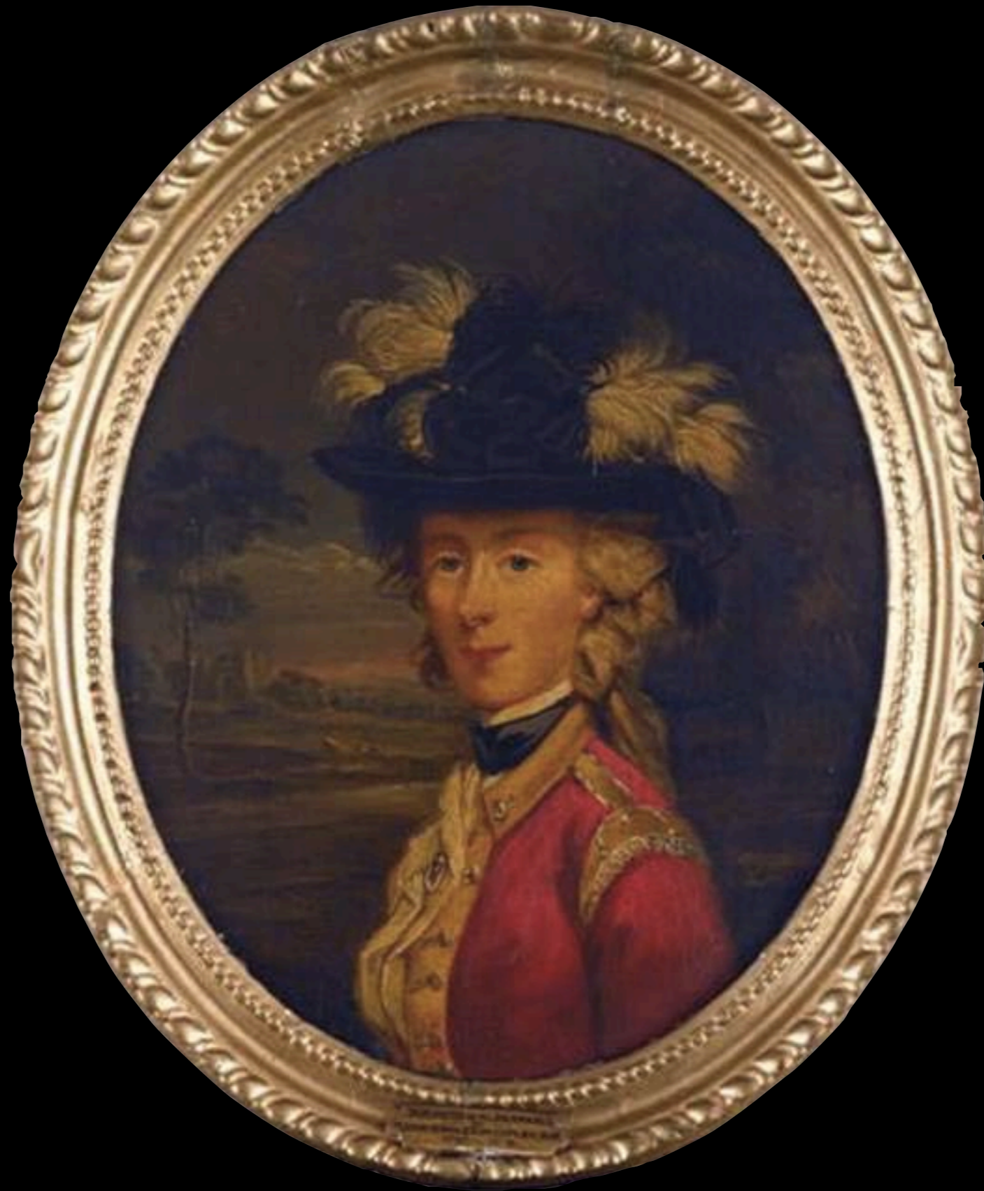
“Duchess of Albermarle” School of John Singleton Copley c. 1776-79