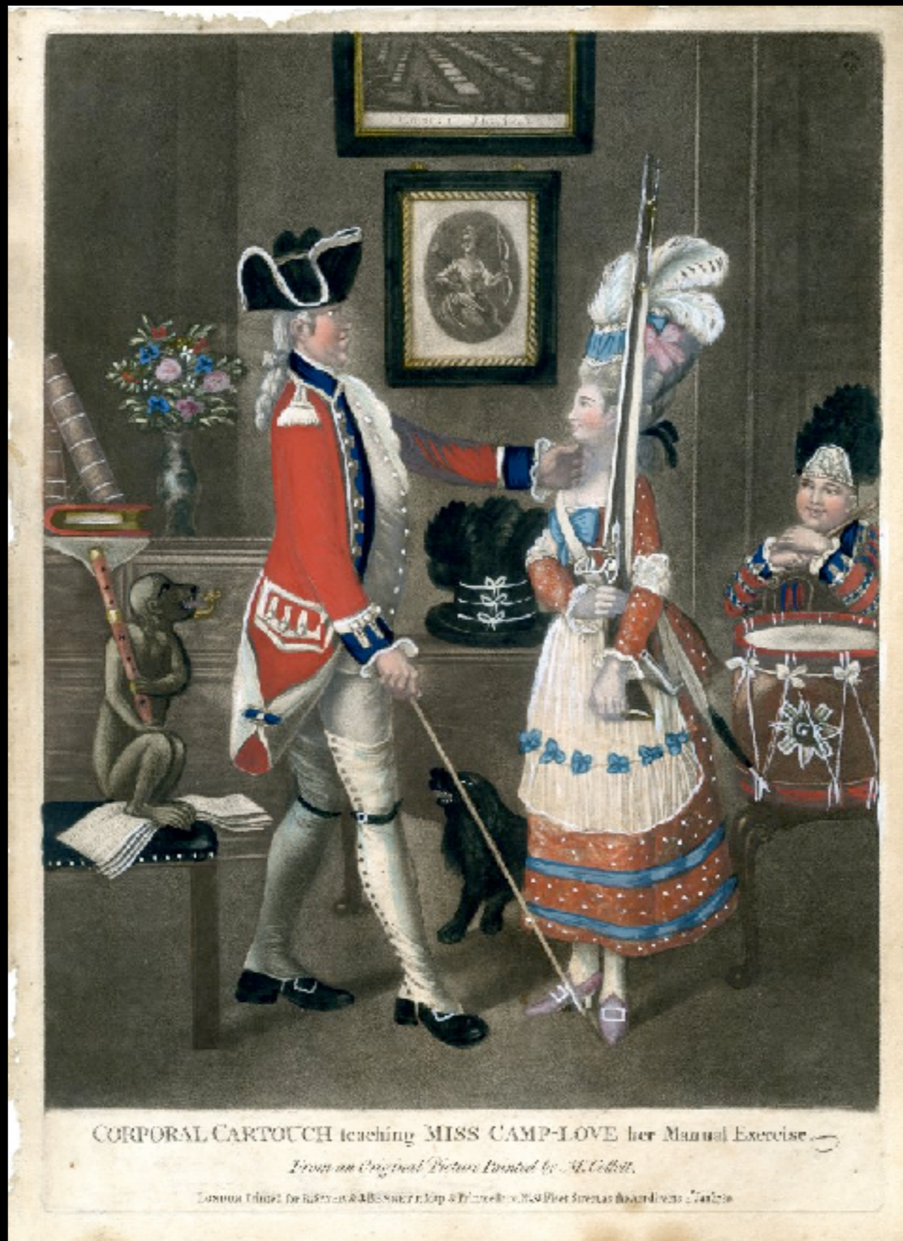
“CORPORAL CARTOUCH teaching MISS CAMP-LOVE her Manual Exercise” by Sayer & Bennett after John Collet 1780 (The British Museum)