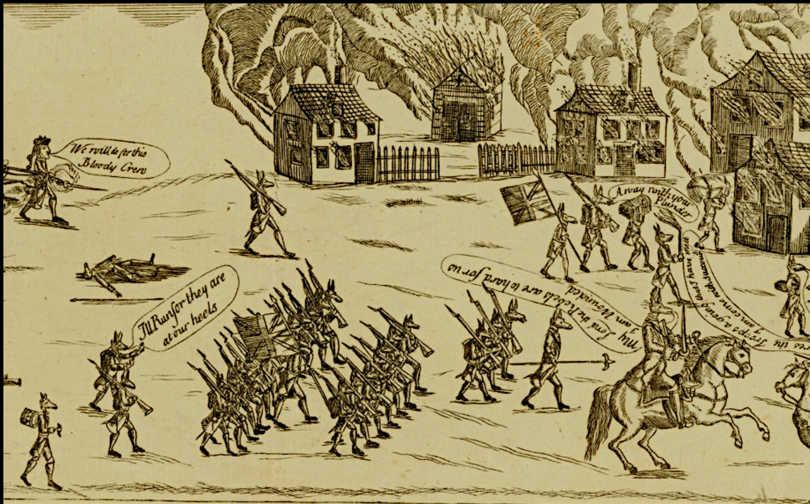
"The Retreat From Concord to Lexington of the Army of Wild Irish Asses Defeated by the Brave American Militia" London, June 19, 1775