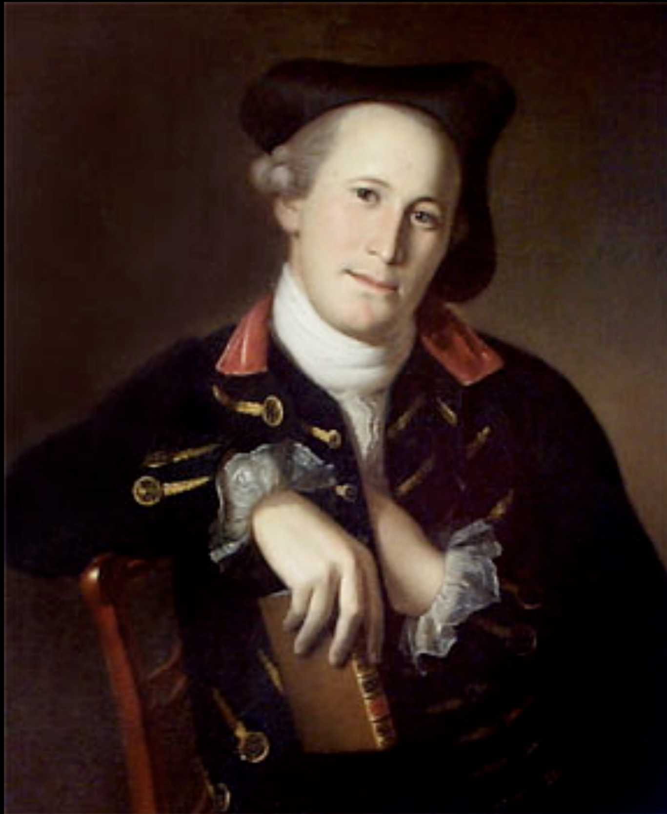
Brigadier General Mordecai Gist The Baltimore Independent Co. 1774 / 5th Maryland Regiment Commander of the Maryland Brigade