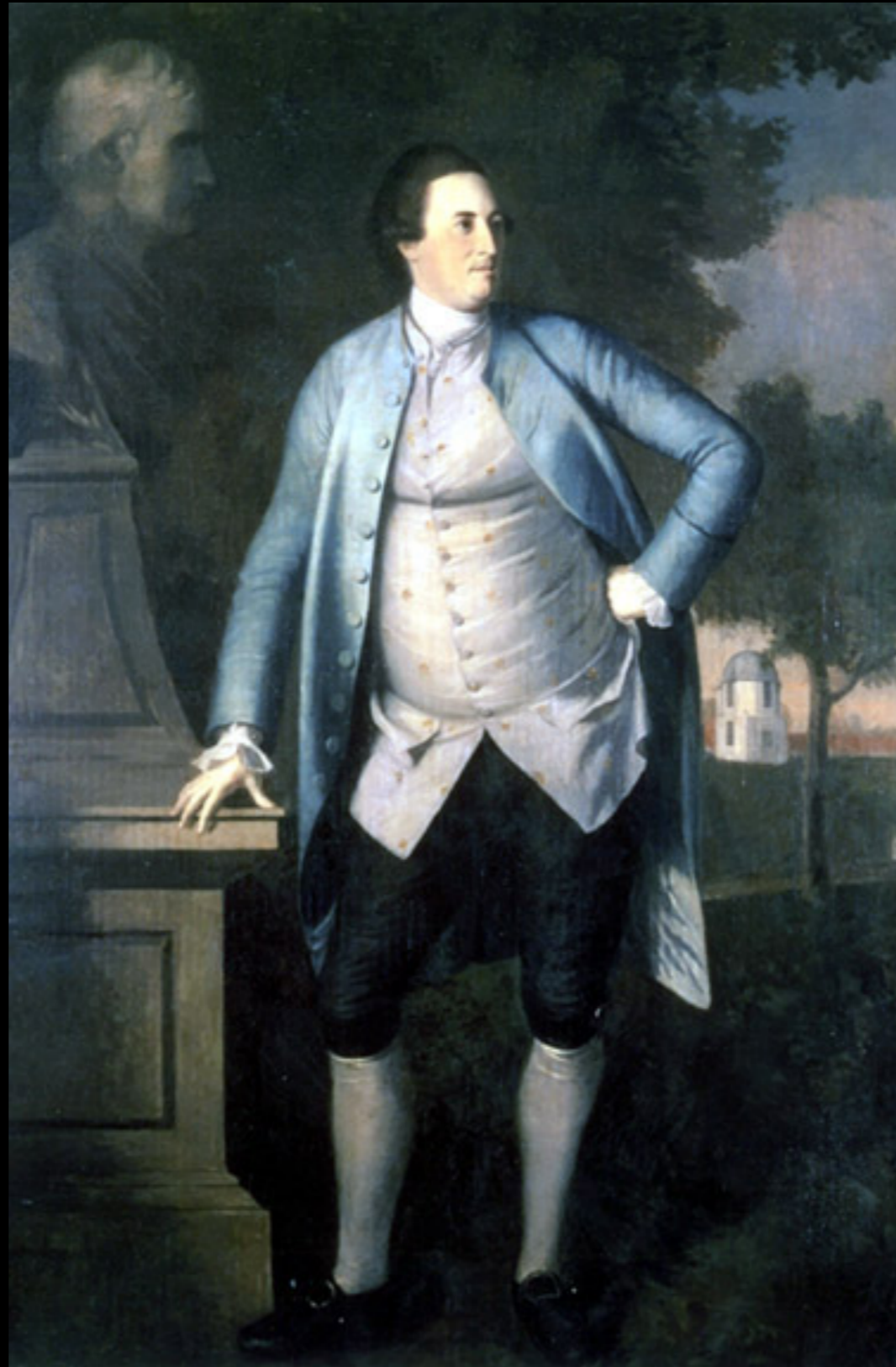
William Paca Maryland Representative to the Continental Congress, Signer of the Declaration of Independence Governor of Maryland 1782 by Charles Wilson Peale