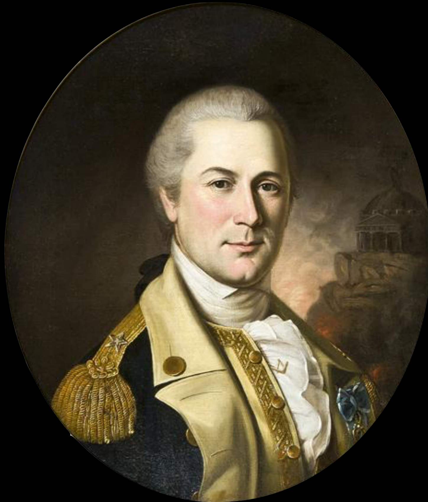
Brigadier General Otho Holland Williams by Charles Wilson Peale 1782 (Pennsylvania Academy of the Fine Arts)