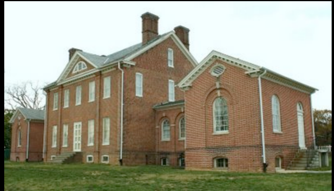
Mount Clare, Baltimore Maryland The Estate of Charles Carroll