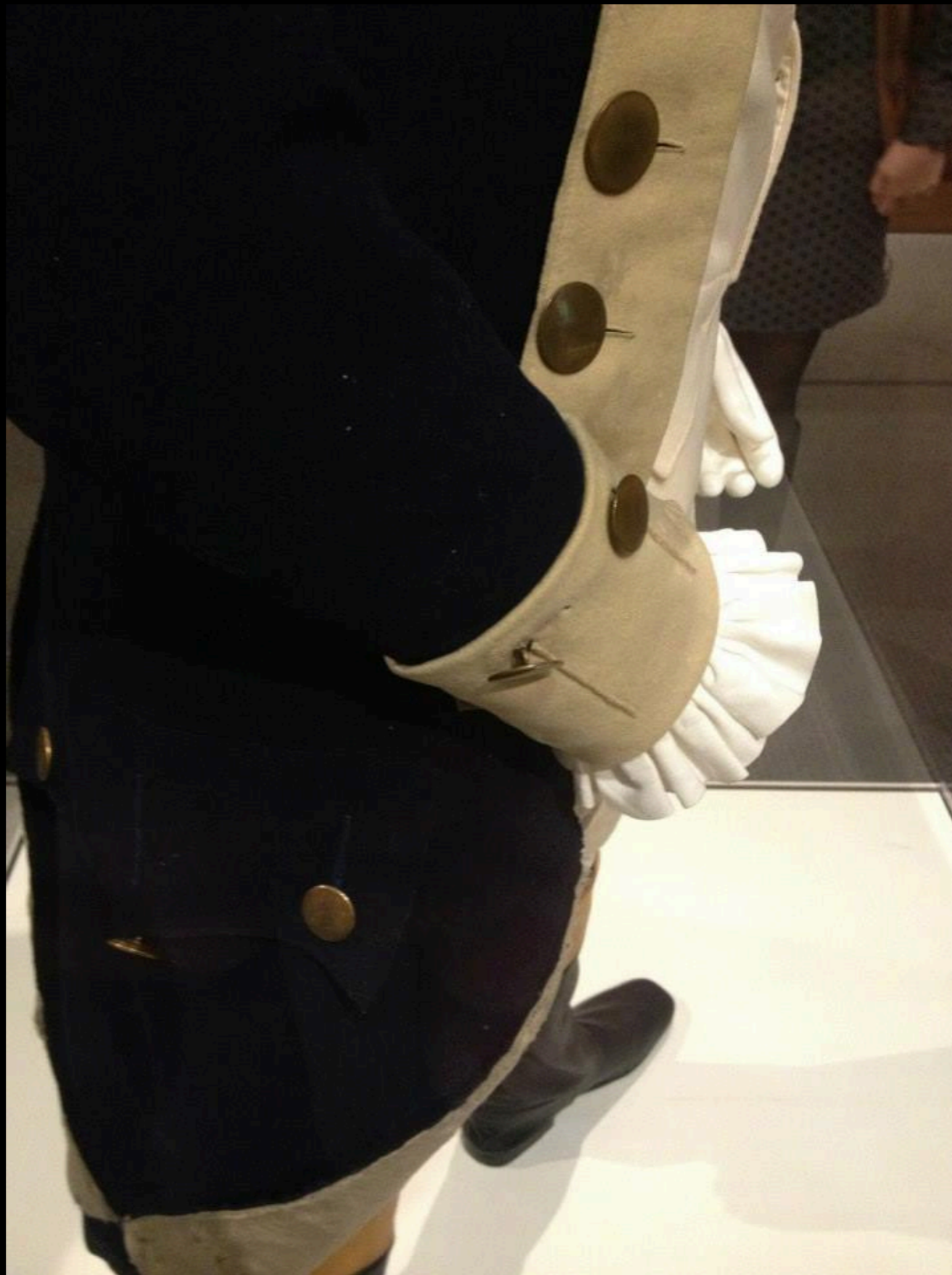
Uniform of Trench Tighlman (Maryland Historical Society)