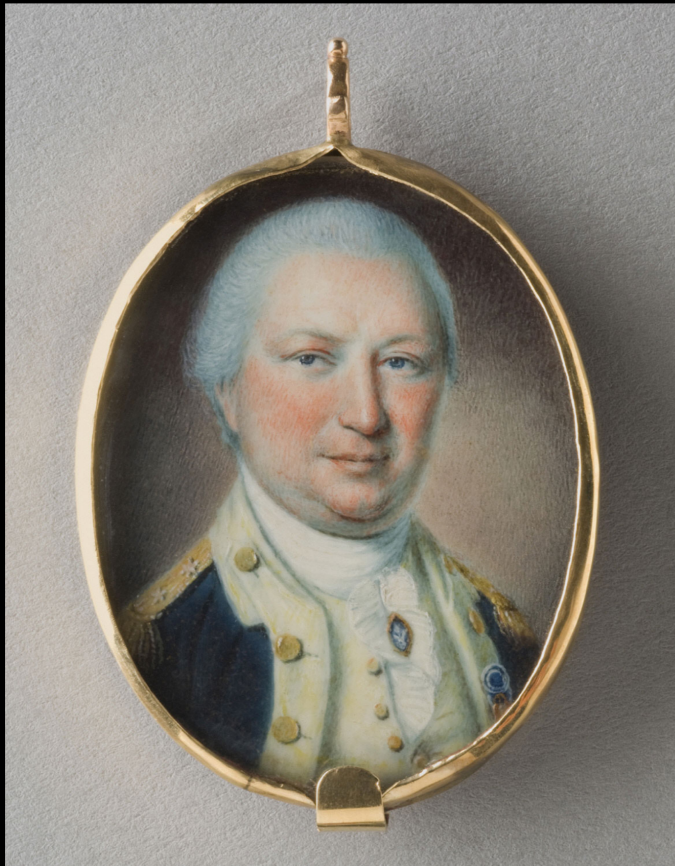
Major General William Smallwood by Charles Wilson Peale c. 1788