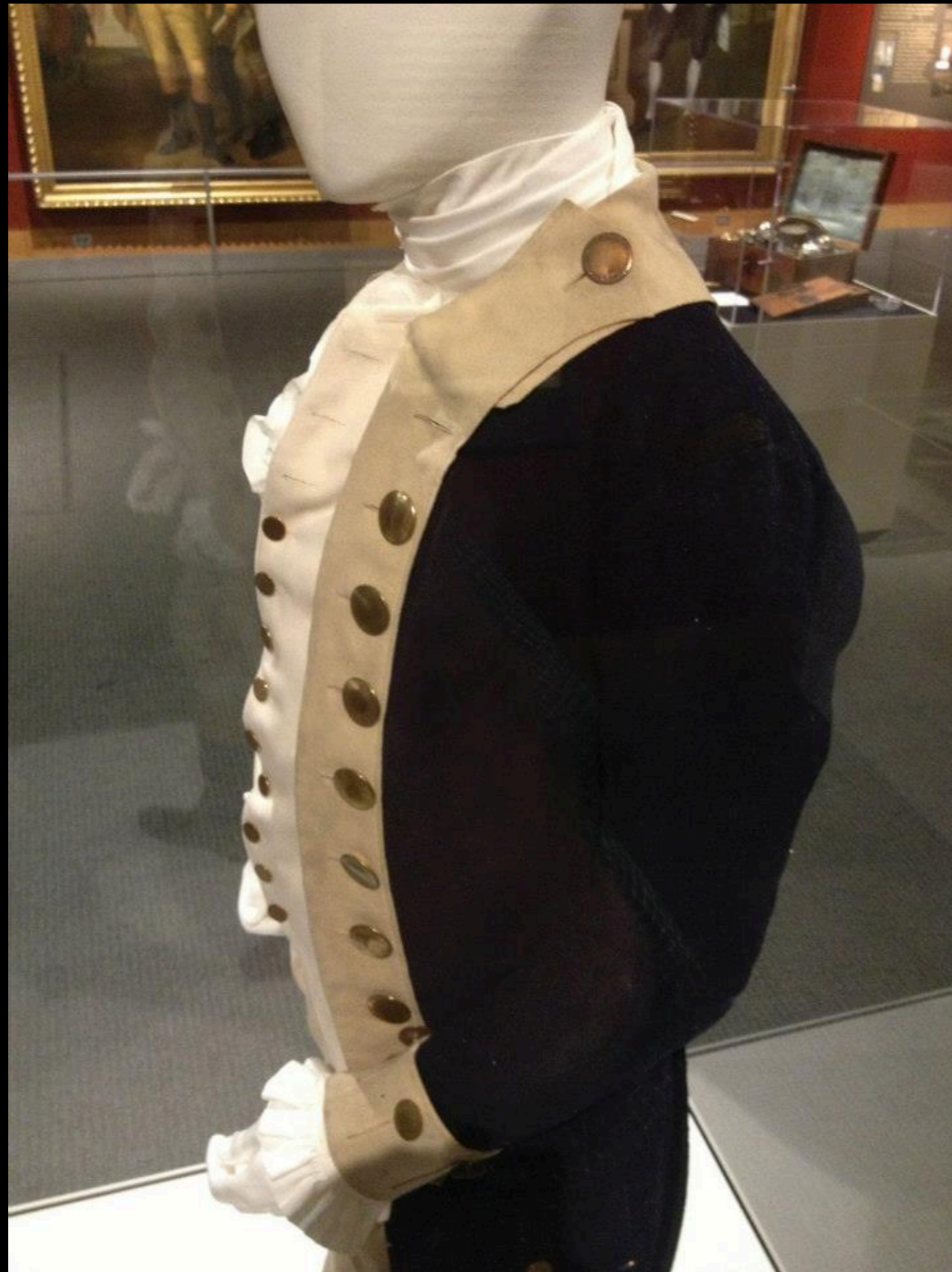
Uniform of Tench Tighlman