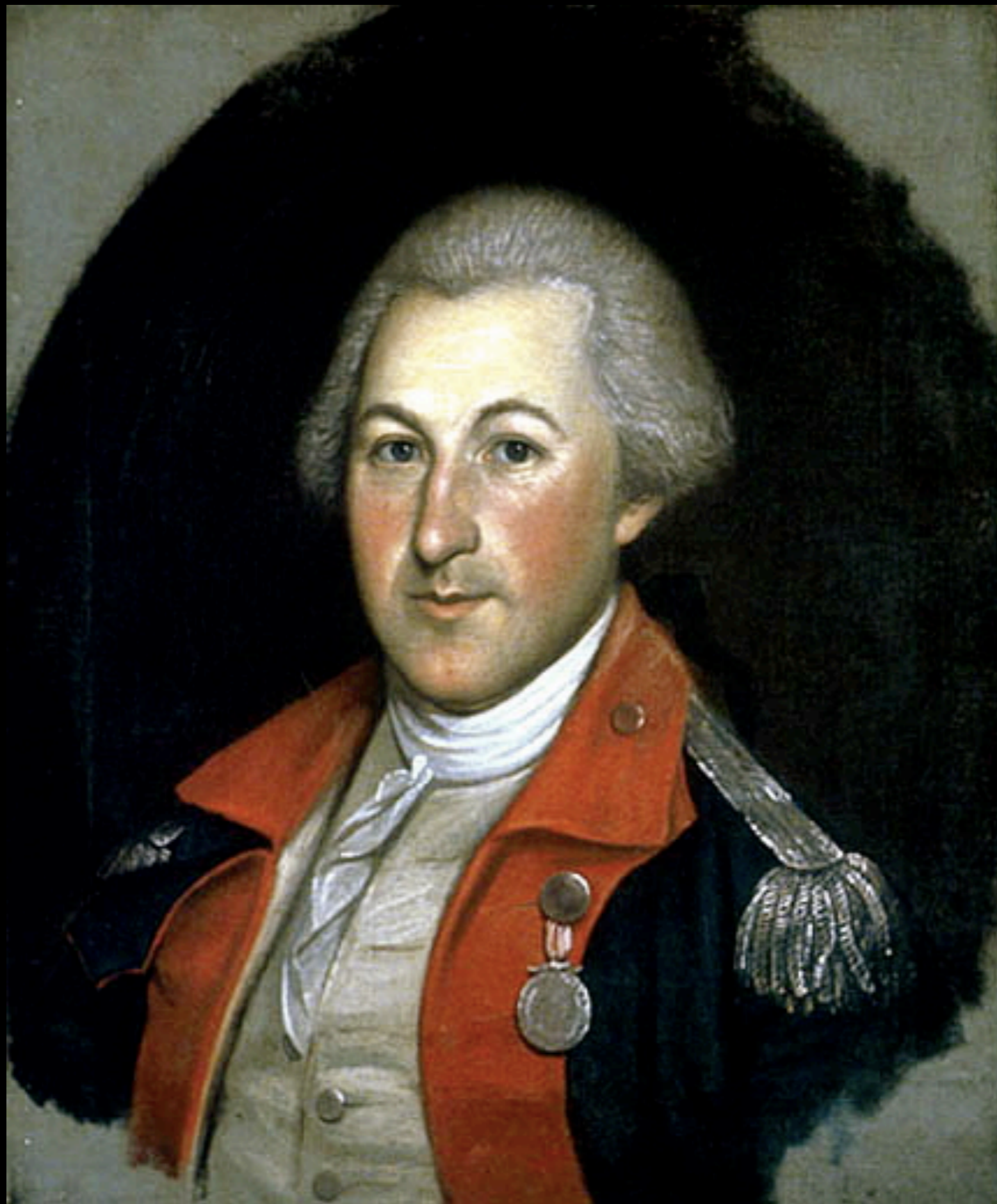
General John Eager Howard by Charles Wilson Peale 1782 (Independence National Historic Park)