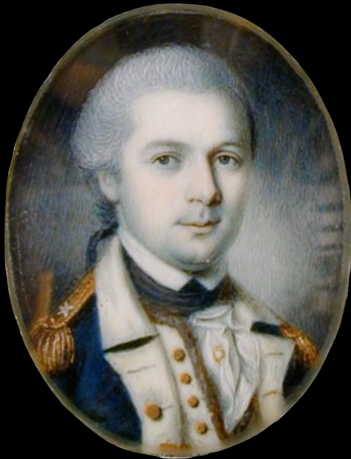
Brigadier General Otho Holland Williams by Charles Wilson Peale