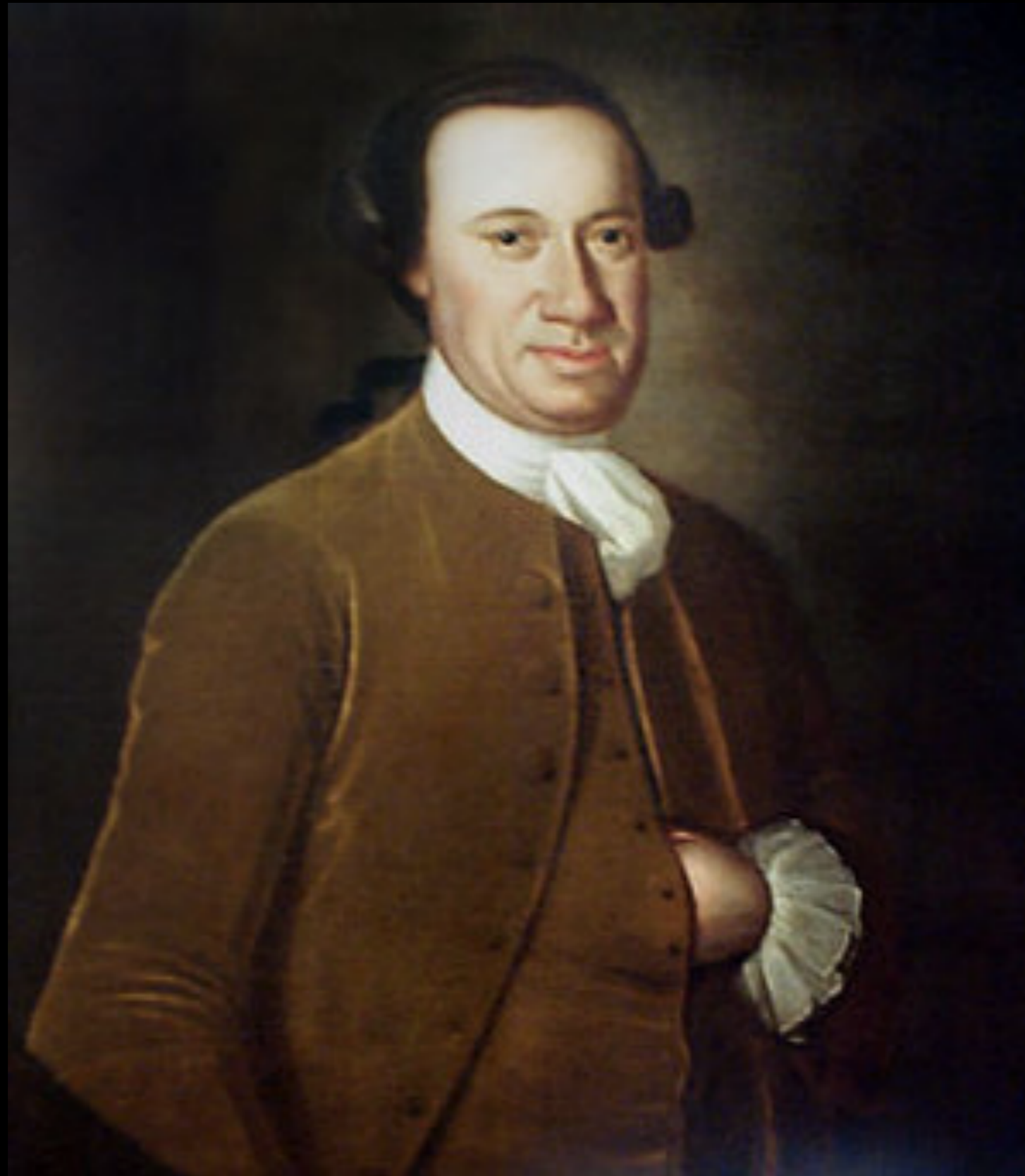
John Hanson of Maryland 9th President of the Continental Congress November 5, 1781 - November 3, 1782