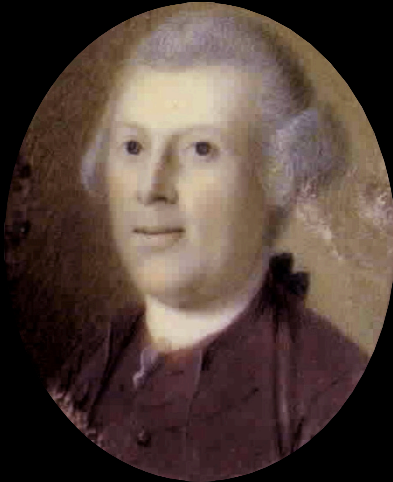
Barrister Charles Carroll Continental Congress - Signer of the Declaration of Independence by Charles Wilson Peale