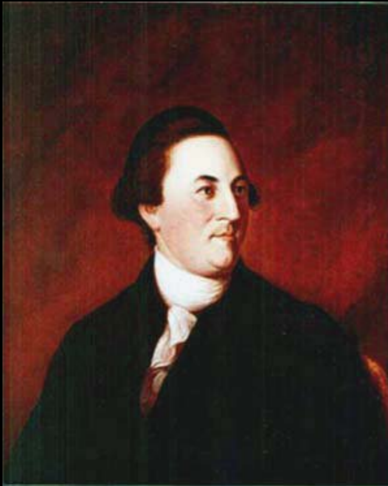
William Paca Maryland Representative to the Continental Congress Signer of the Declaration of Independence Governor of Maryland 1782