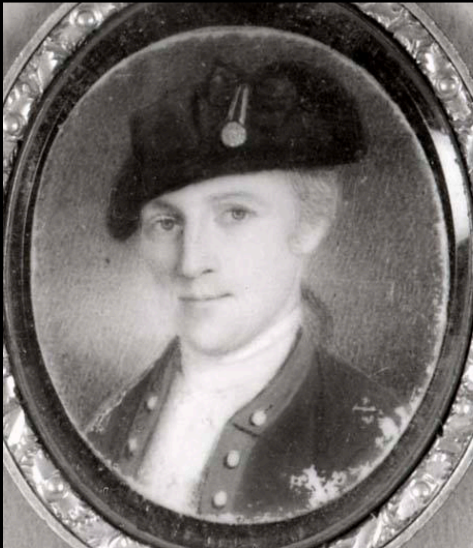
An Unknown Officer of the Maryland Continental Line by Charles Wilson Peale c. 1778 (Private Collection - Frick Art Reference Library)