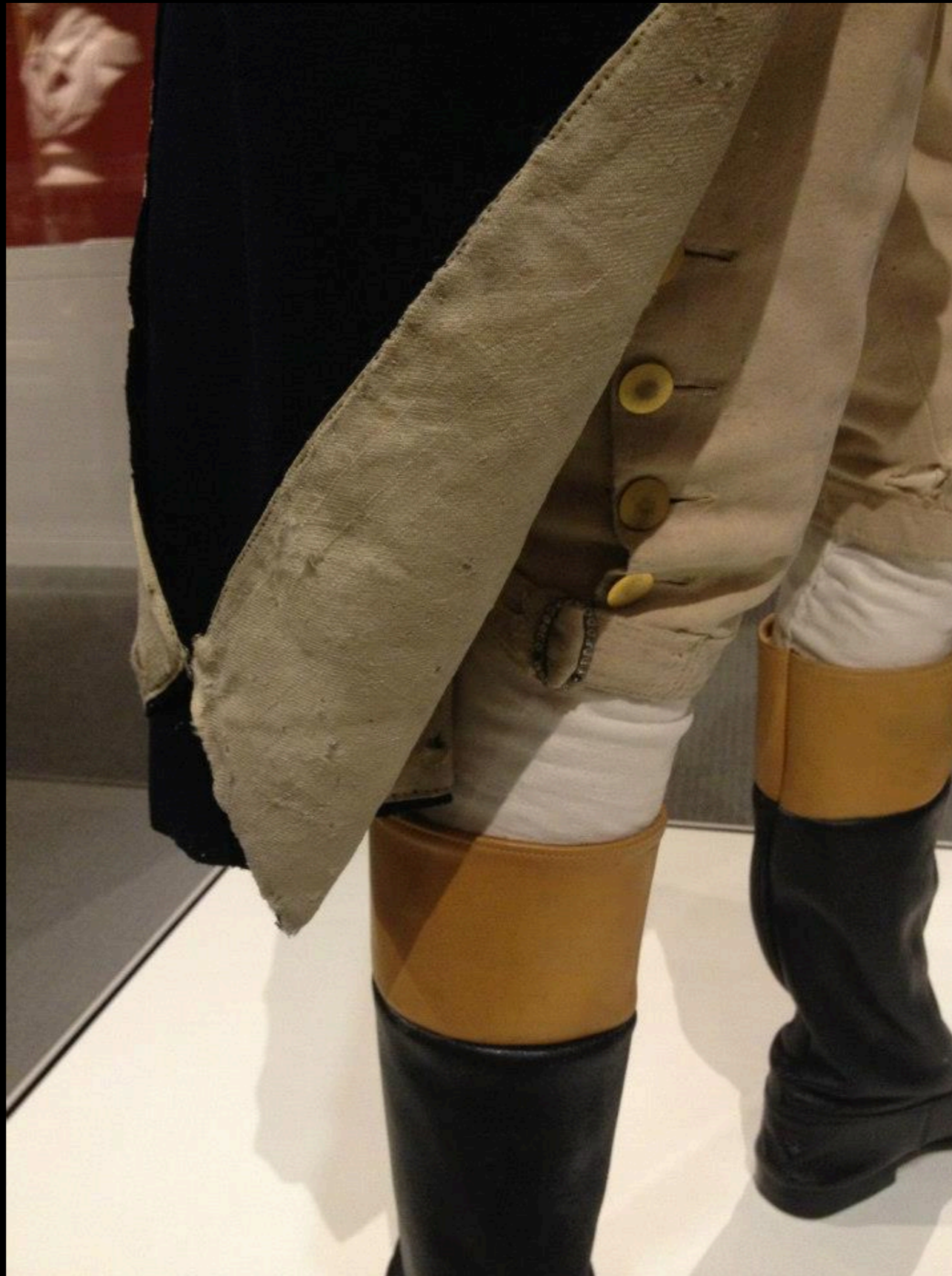
Uniform of Tench Tighlman (Maryland Historical Society)