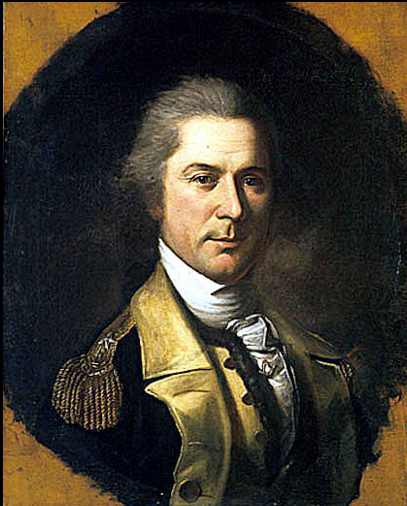
Brigadier General Otho Holland Williams by Charles Wilson Peale 1784 (Independence National Historic Park)