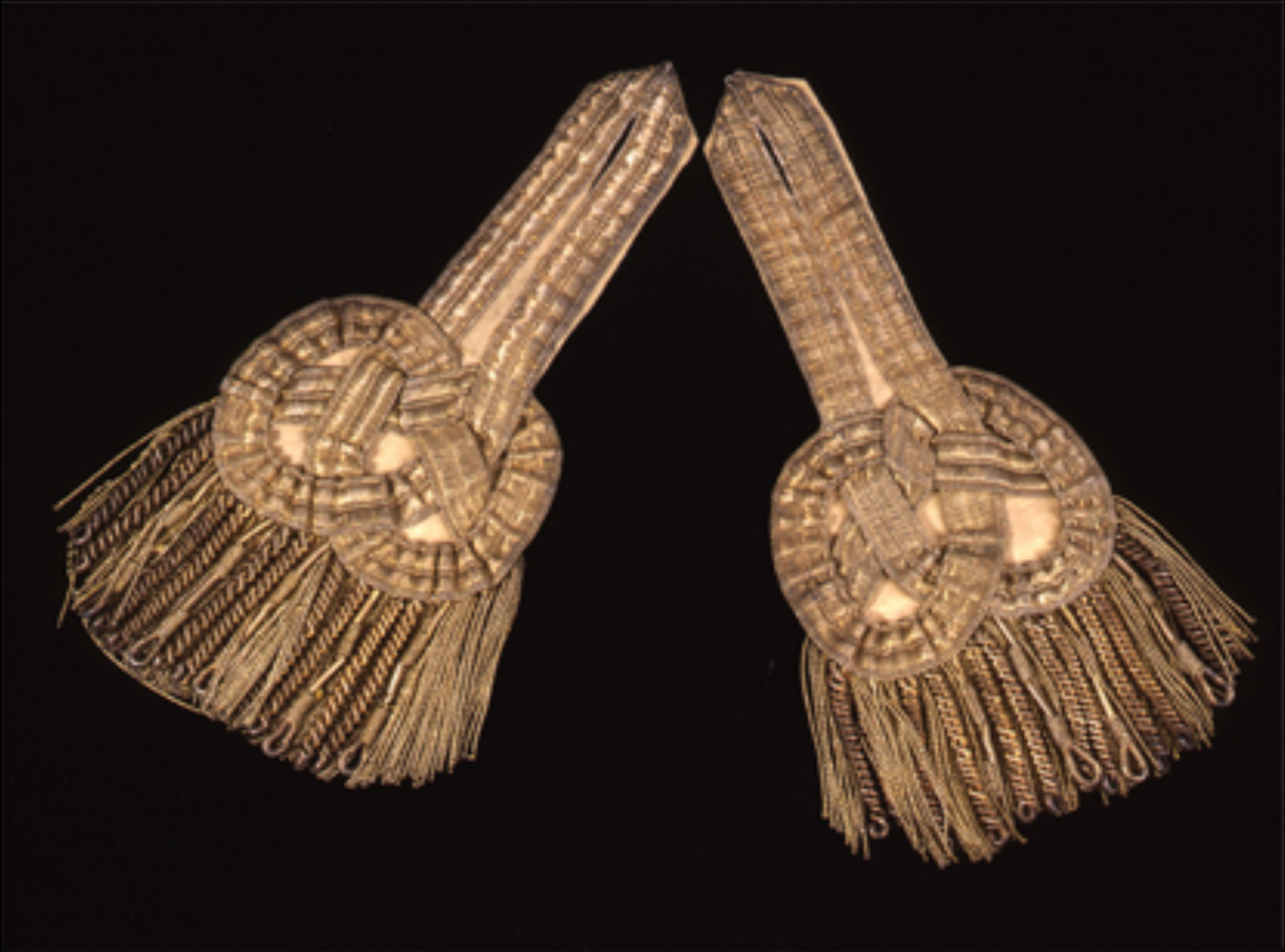
Epaulettes of Tench Tighlman (The Society of the Cincinatti)