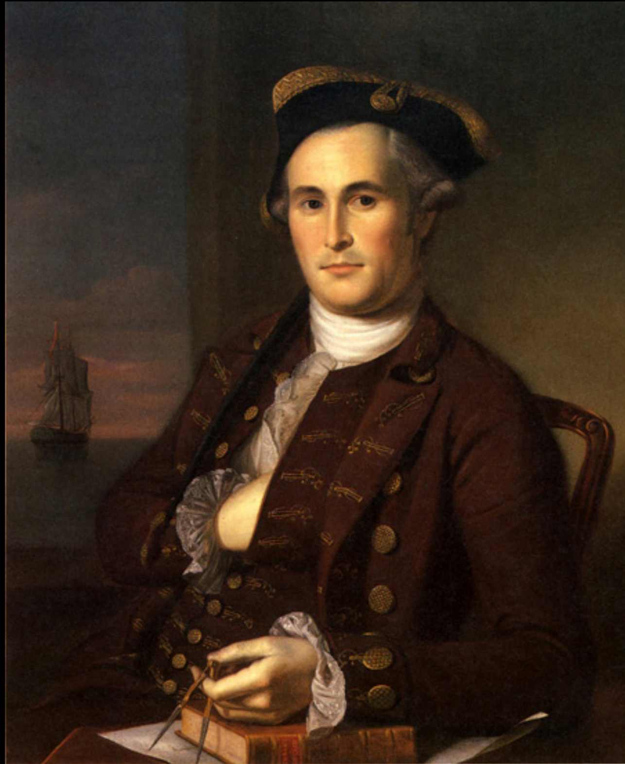
Brigadier General Mordecai Gist The Baltimore Independent Co. 1774 / 5th Maryland Regiment Commander of the Maryland Brigade