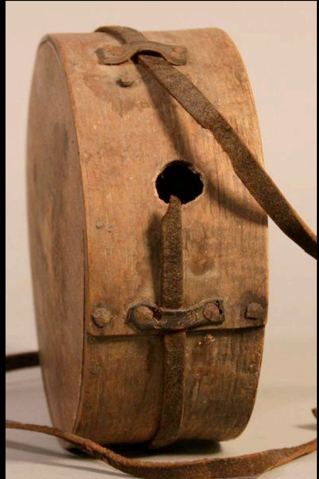
Wood Canteen with Narrow Leather Keepers Marked "E A" 18th Century (Private Collection)