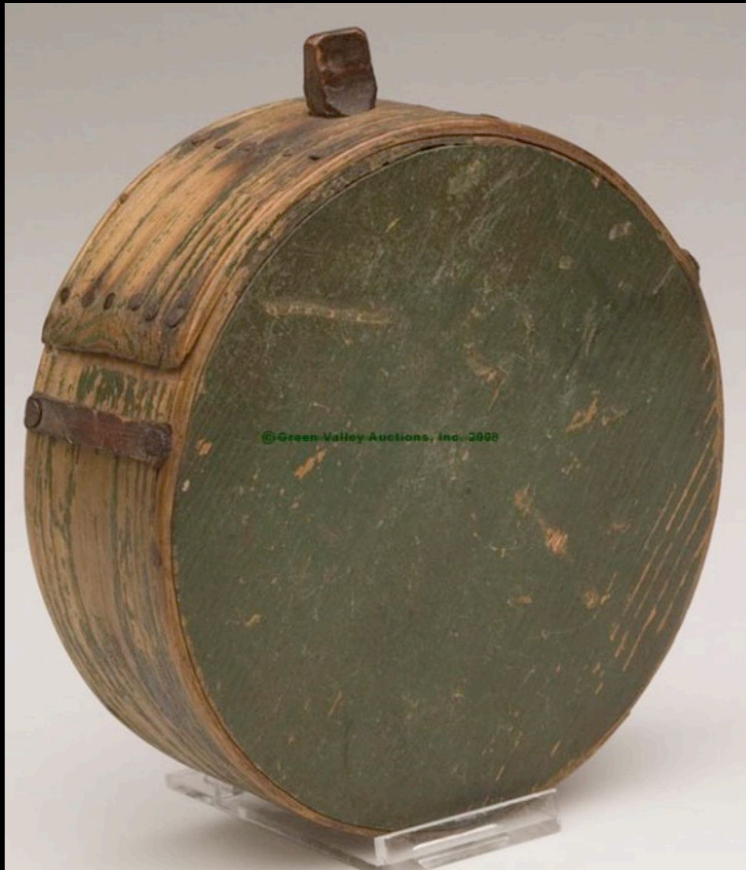
Wood Canteen in Green Paint & Leather Keepers Late 18th - Early 19th Century (Green Valley Auctions)