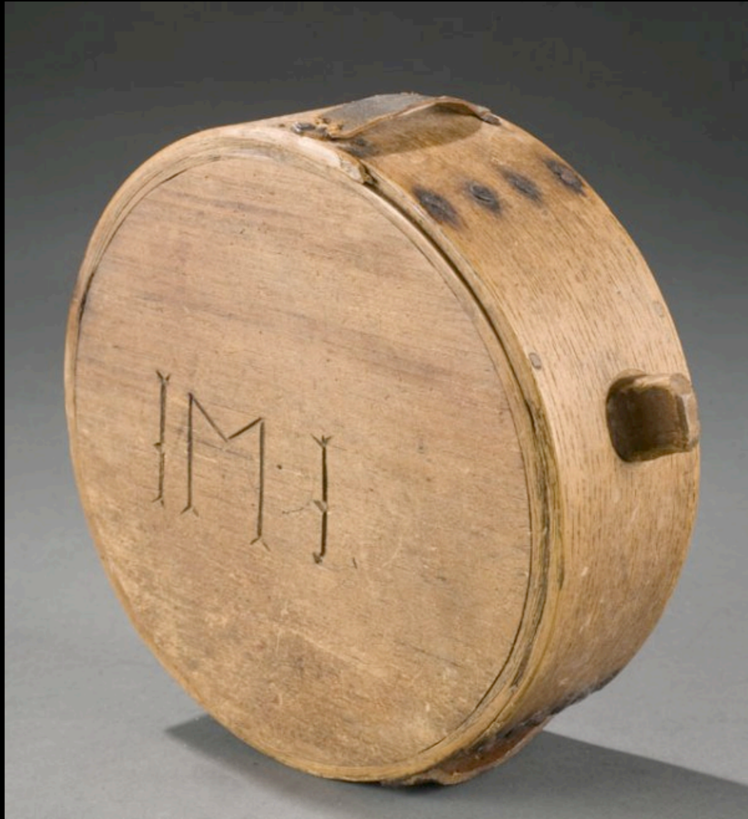
Wood Canteen with Wide Leather Keeps 18th - Early 19th Century (Private Collection)