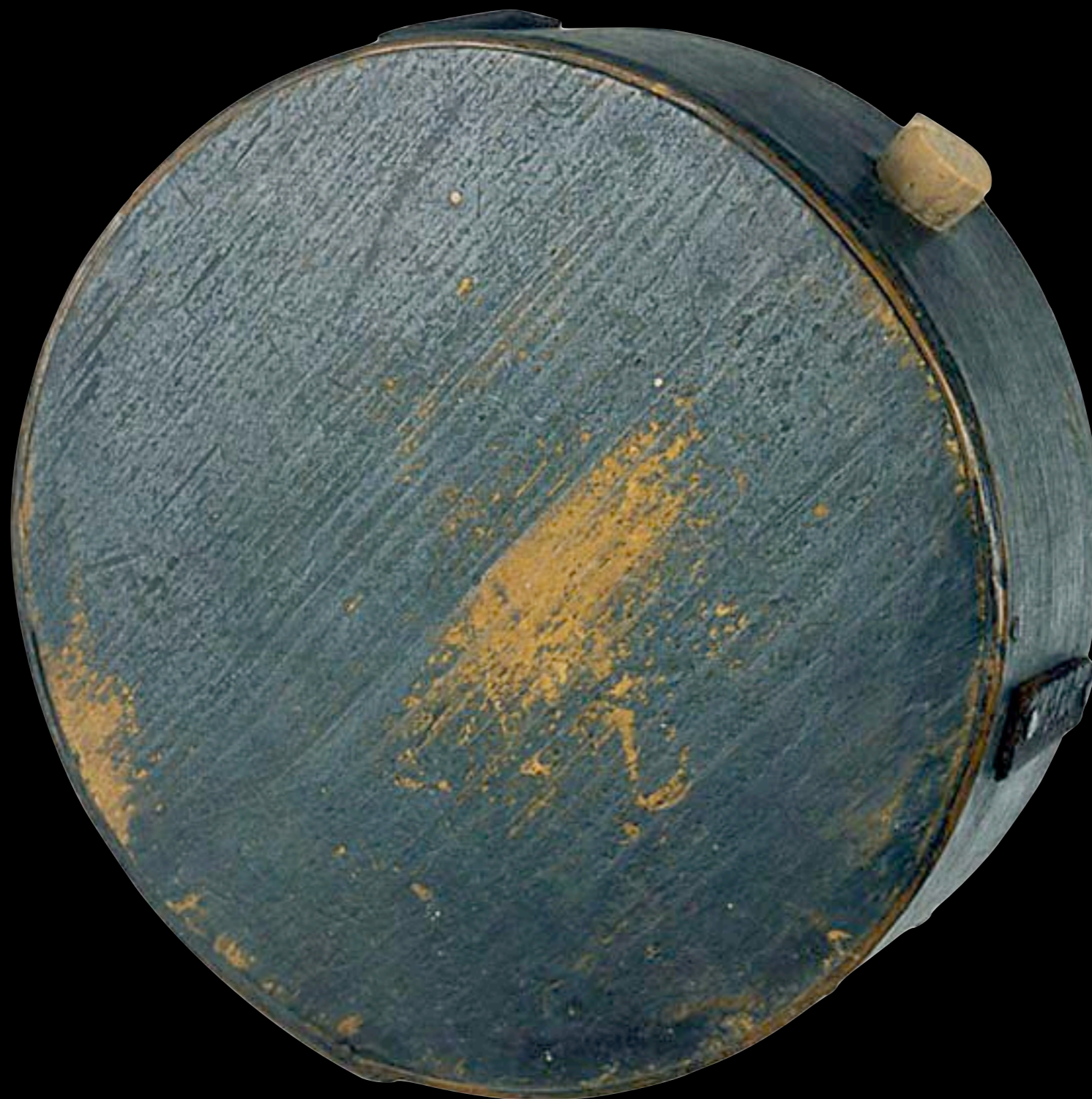
Wood Canteen with Narrow Leather Keepers Late 18th - Early 19th Century (Private Collection)