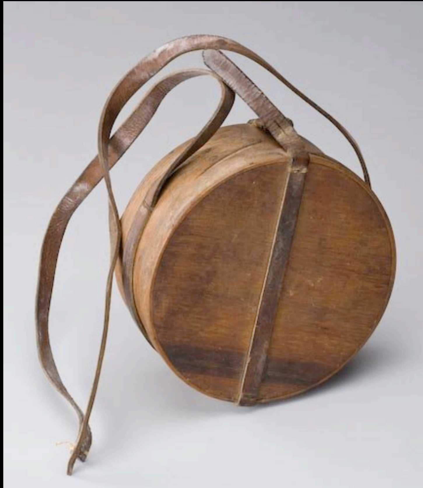
Wood Canteen with Leather Straps Secured by Small Iron Staples Late 18th - Early 19th Century (Private Collection)