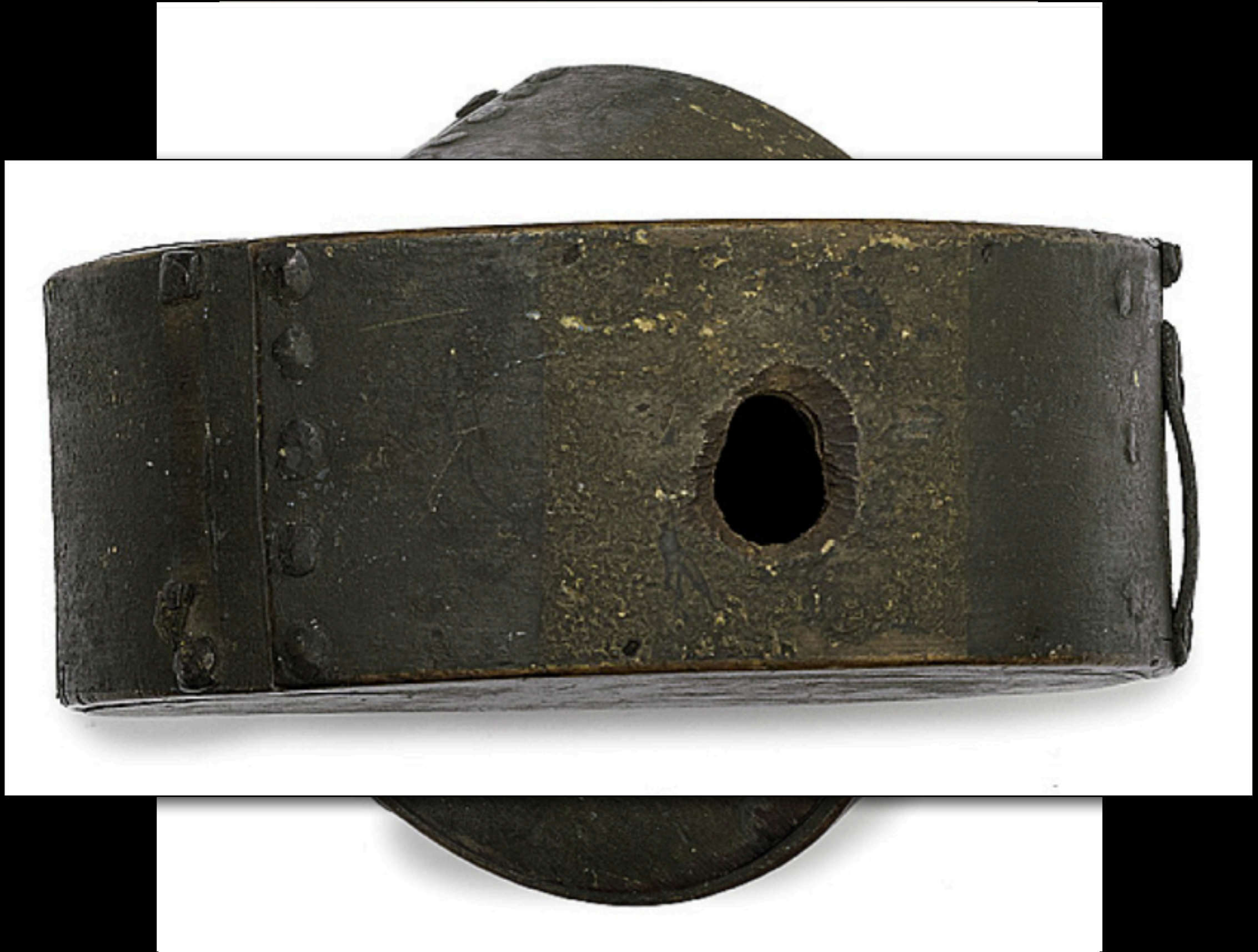
Wood Canteen with Leather Keepers in Green Paint Late 18th - Early 19th Century (Cowan Auction House)