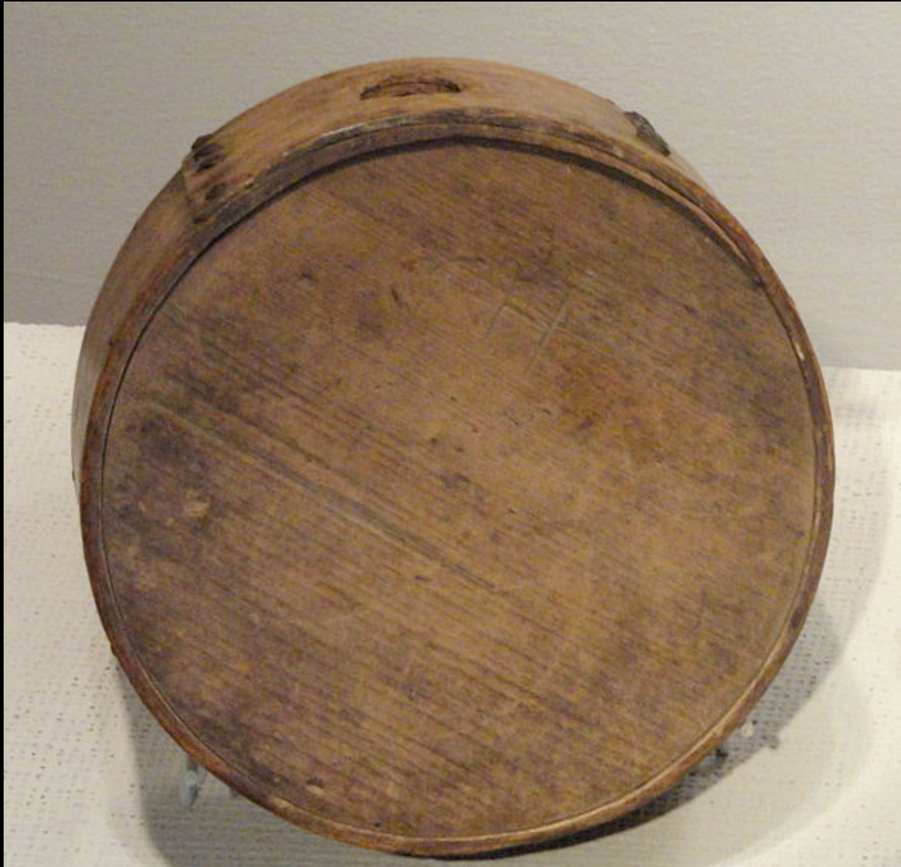
Wood Canteen found in North Carolina with Leather Keepers c. 1750 - 1820 (North Carolina Museum of History)