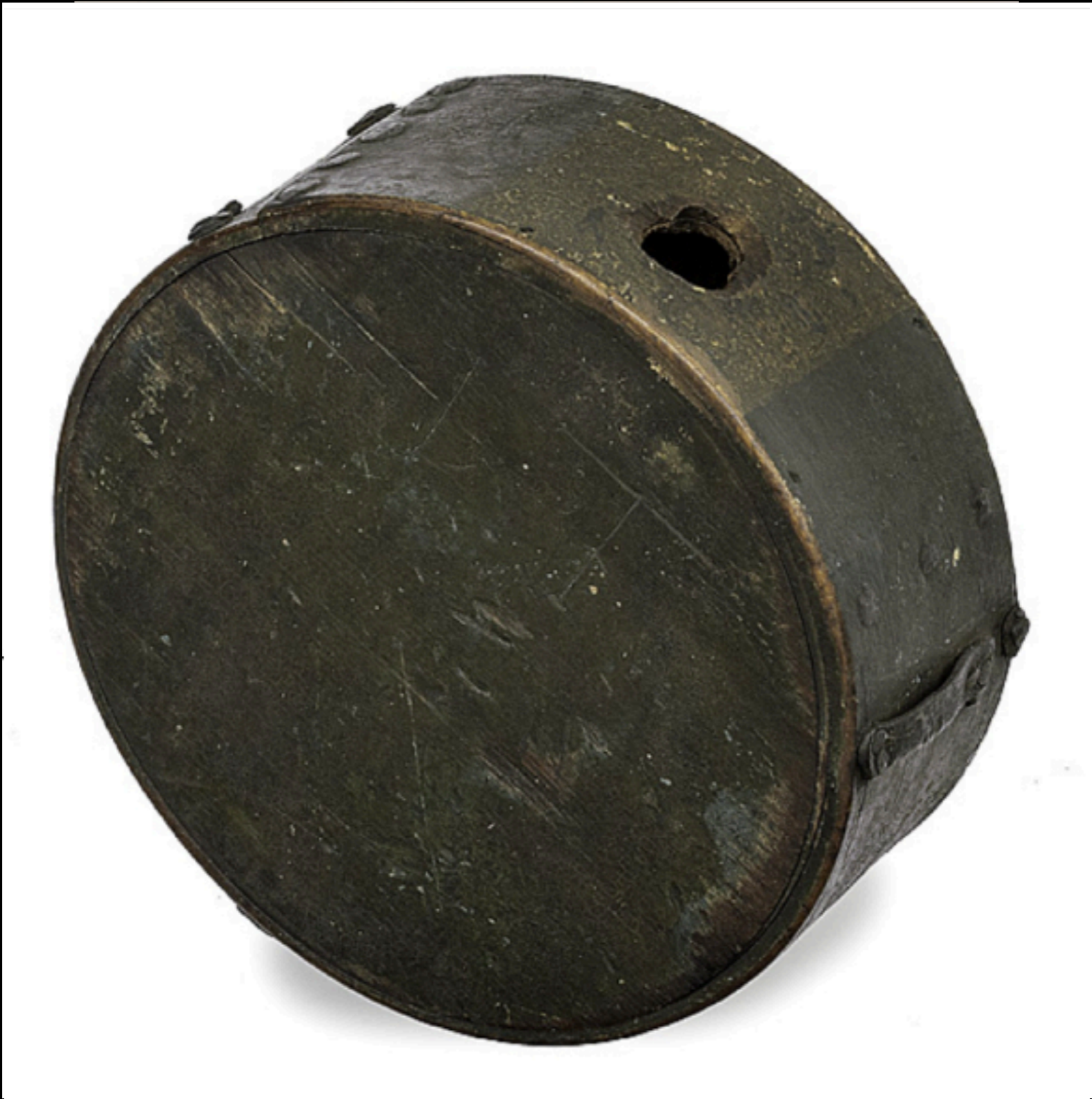
Wood Canteen with Leather Keepers in Green Paint Late 18th - Early 19th Century (Cowan Auction House)