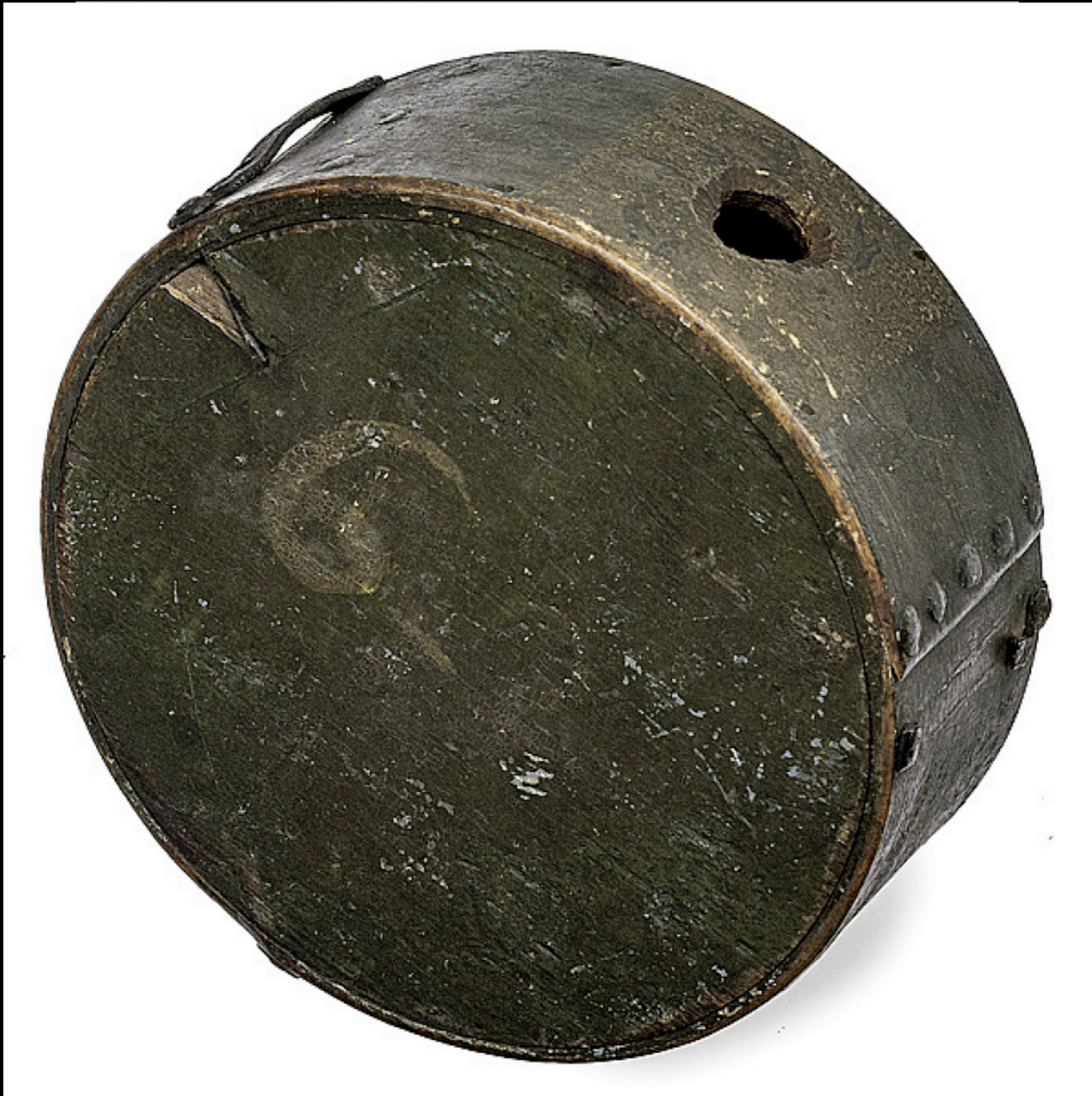
Wood Canteen with Leather Keepers in Green Paint Late 18th - Early 19th Century (Cowan Auction House)