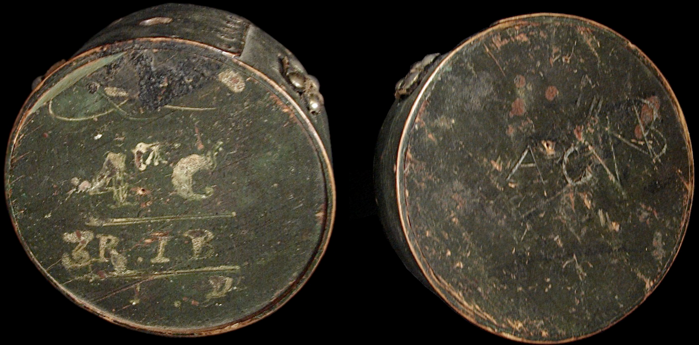
Wood Canteen Marked "4TH C - 3R - 1B" with Leather Keepers secured with Brass Tacks Possible 4TH Connecticut Regiment but probably Post - Revolution