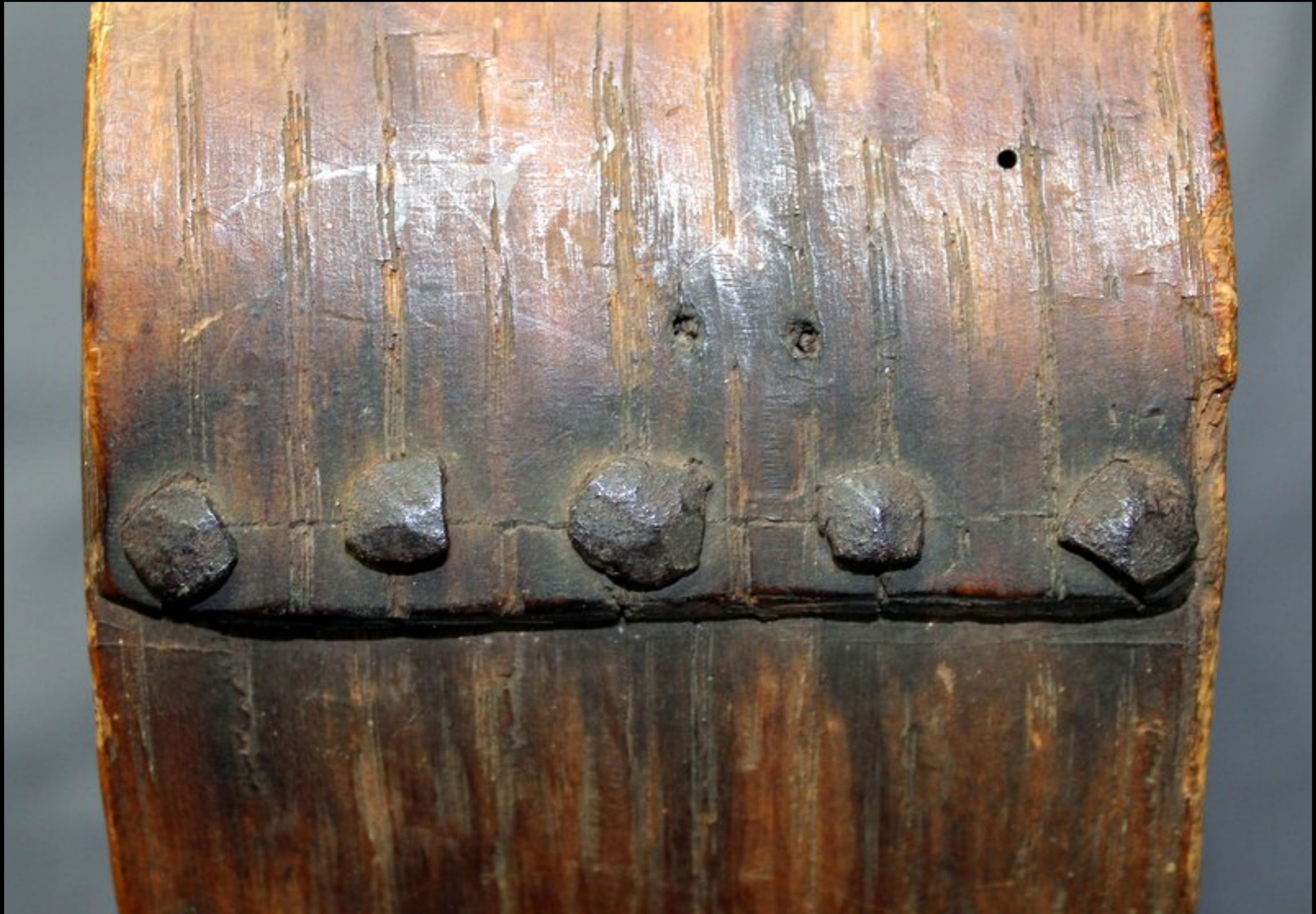
Wood Canteen that Held Narrow Leather Keepers (Based on Remaining Nails) Marked "AK" "JL" 1777 / 1814