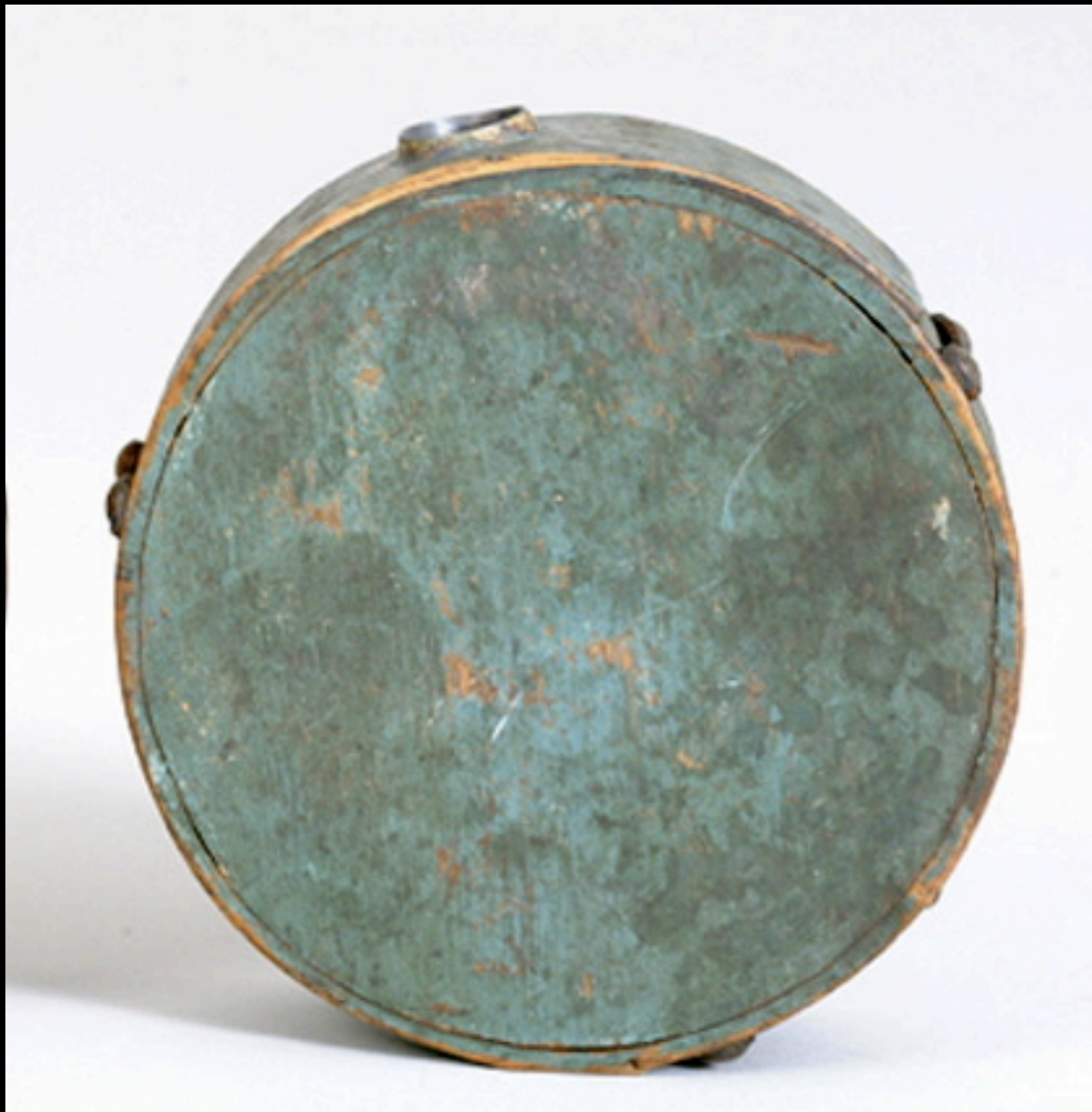
Wood Canteen with Pewter Spout & Leather Keepers Secured with Brass Tacks in Blue Paint (Estate of Tom Wnuck)