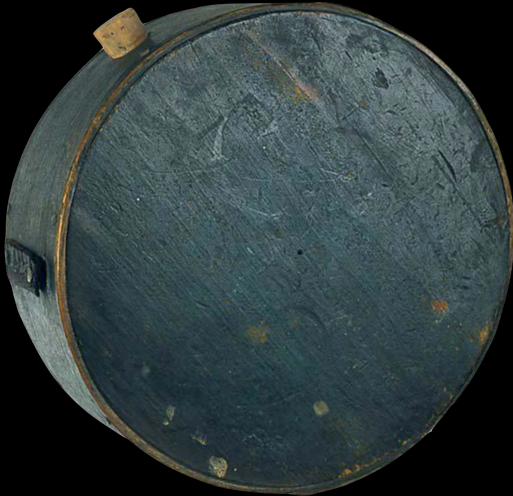
Wood Canteen with Narrow Leather Keepers Late 18th - Early 19th Century (Private Collection)