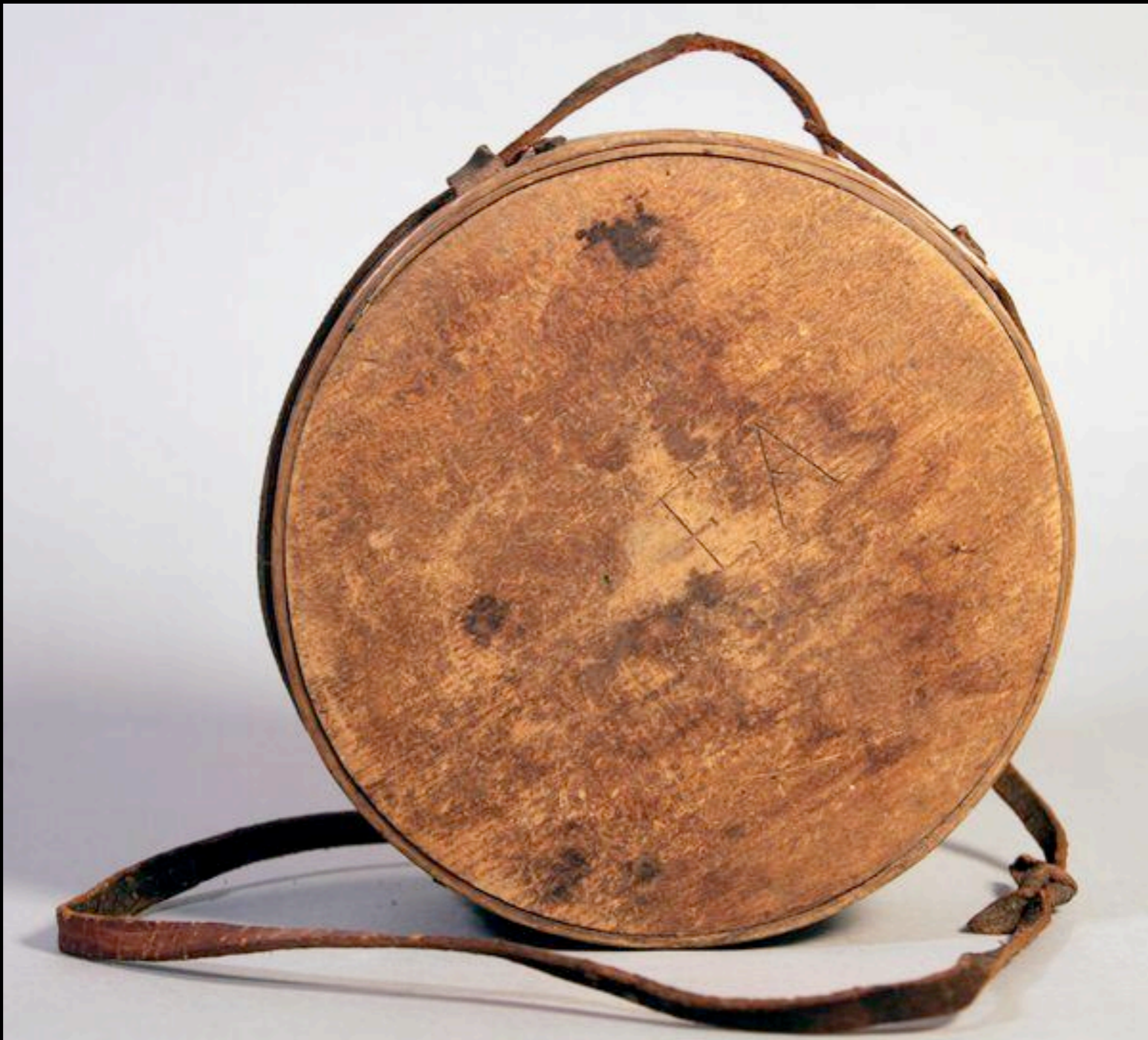
Wood Canteen with Narrow Leather Keepers Marked "E A" 18th Century (Private Collection)