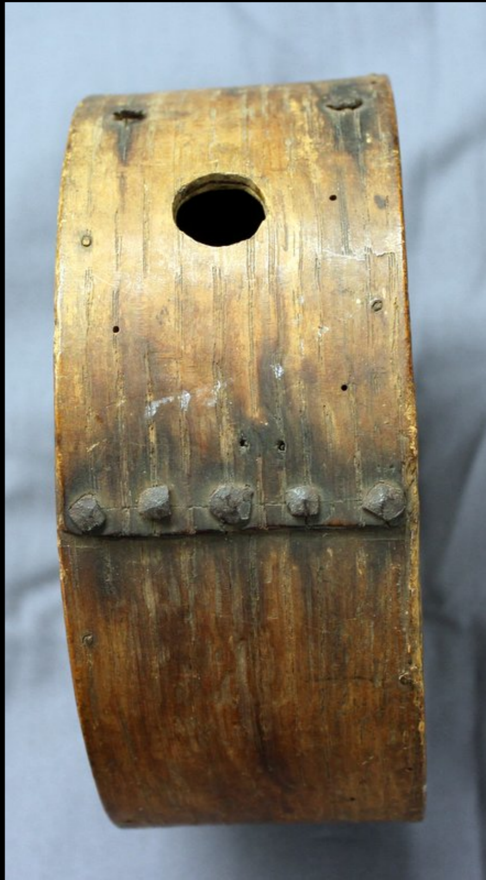
Wood Canteen that Held Narrow Leather Keepers (Based on Remaining Nails) Marked "AK" "JL" 1777 / 1814