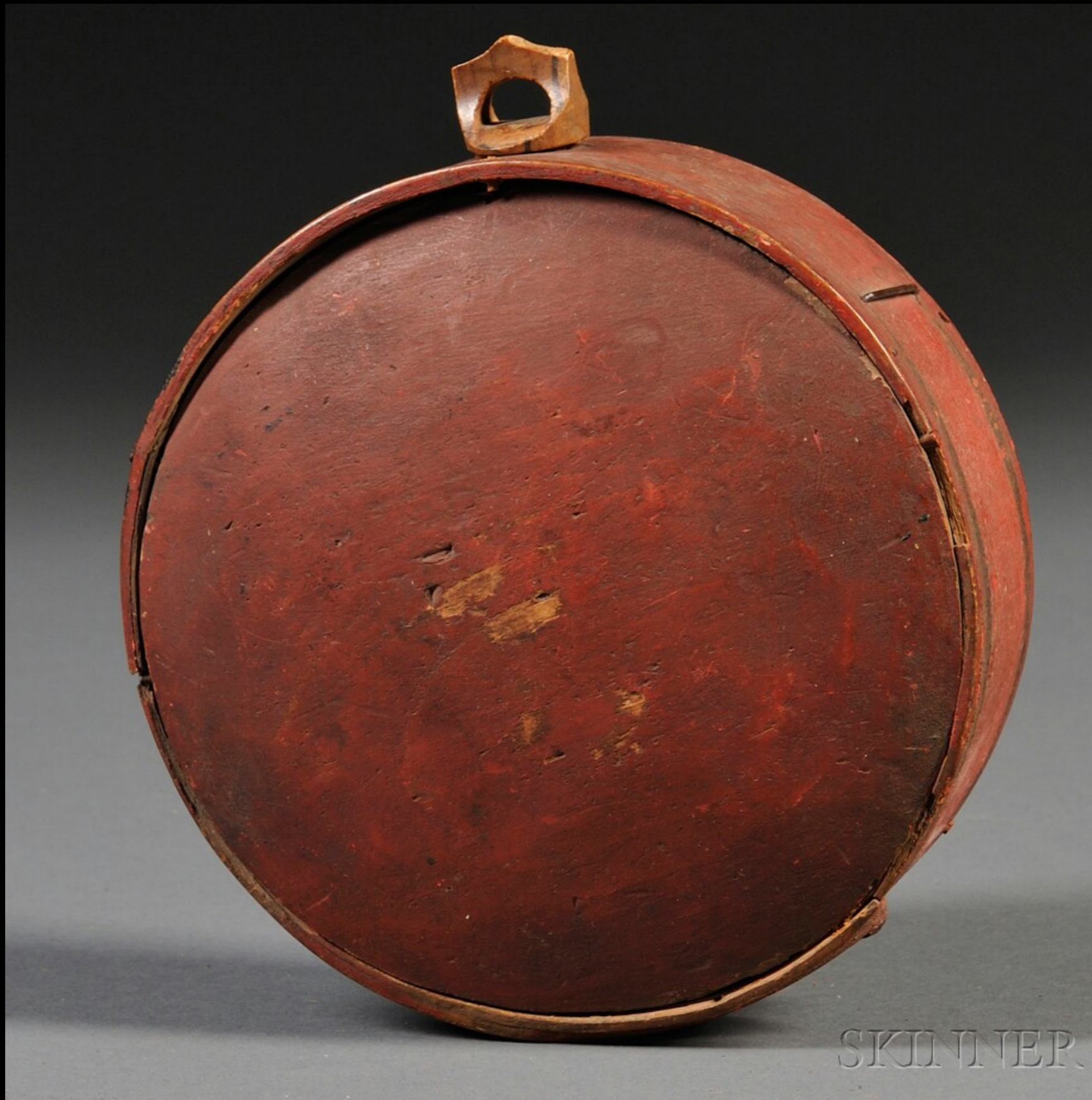
Militia Canteen in Red Paint with Narrow Iron Staples Late 18th - Early 19th Century