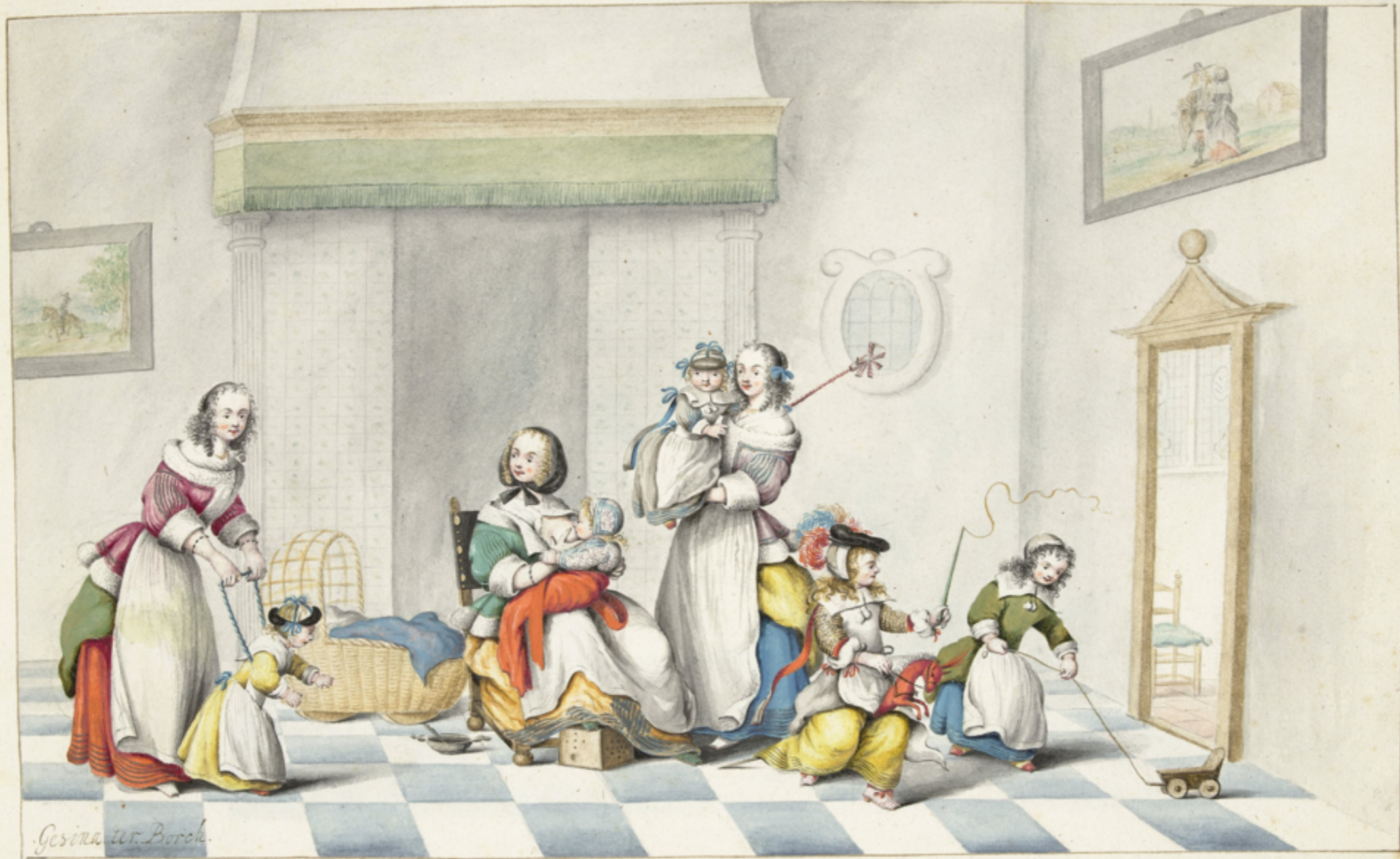
Nursery by Gesina ter Borch c. 1660 - 1661