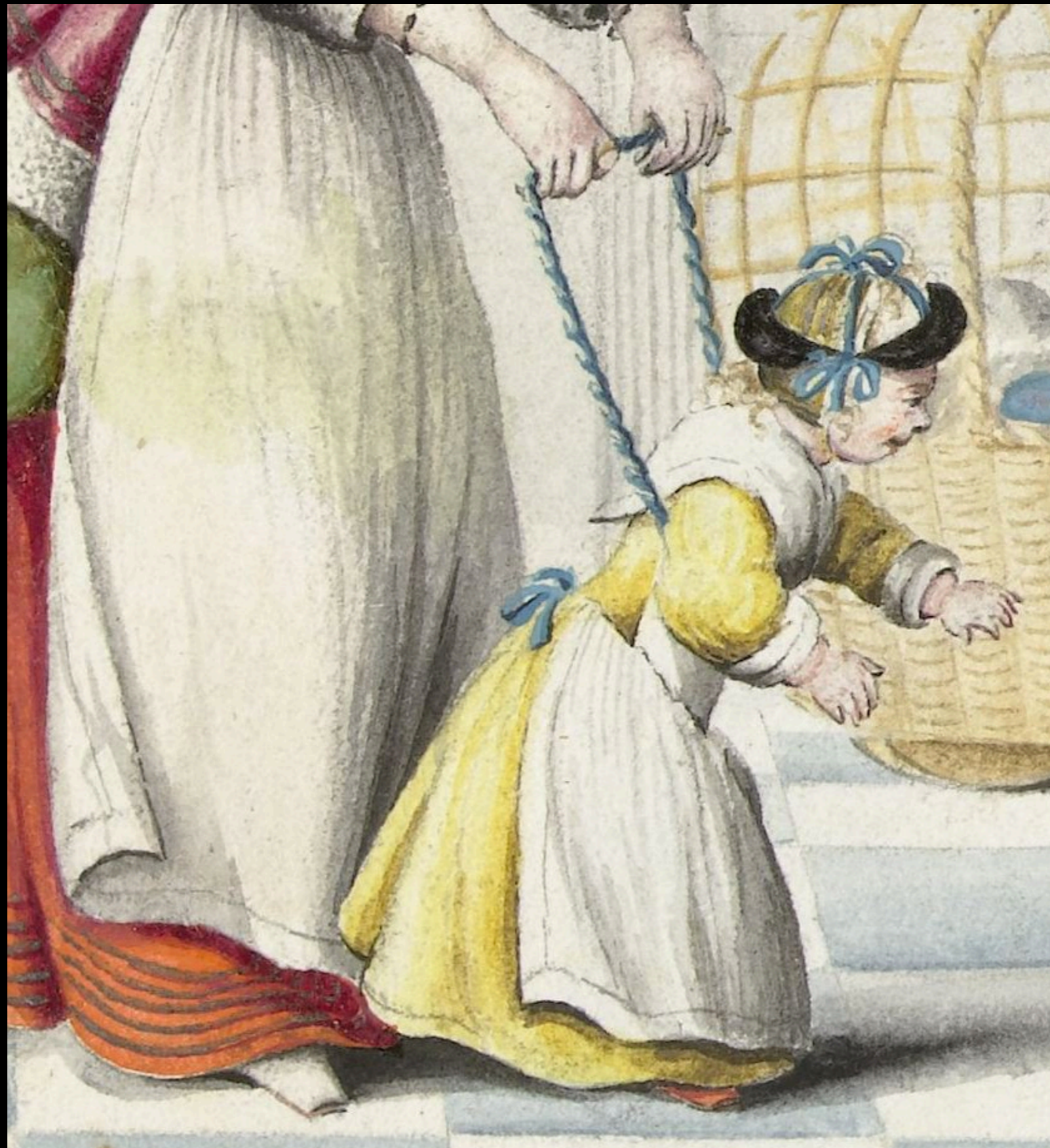
Nursery by Gesina ter Borch c. 1660 - 1661 (Rijksmuseum)