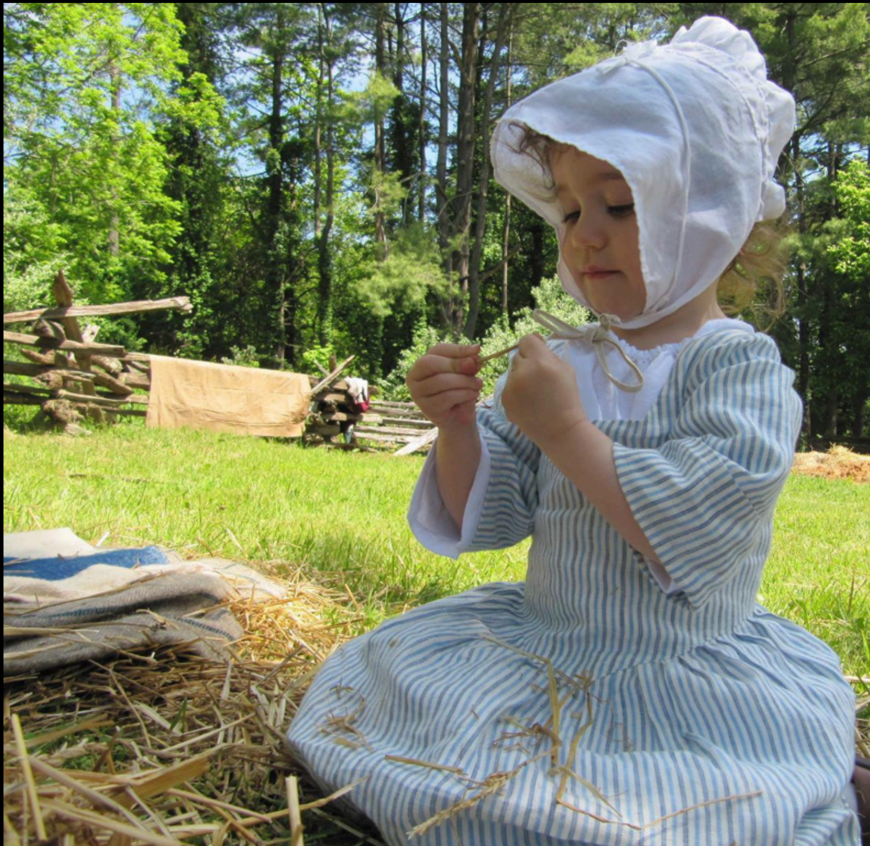
A Child's Cap Recreated