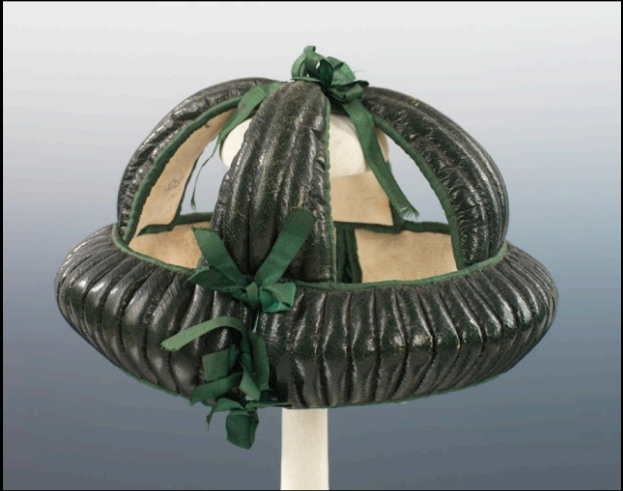
Child's "Pudding" Cap of Silk 18th Century (Metropolitan Museum of Art)