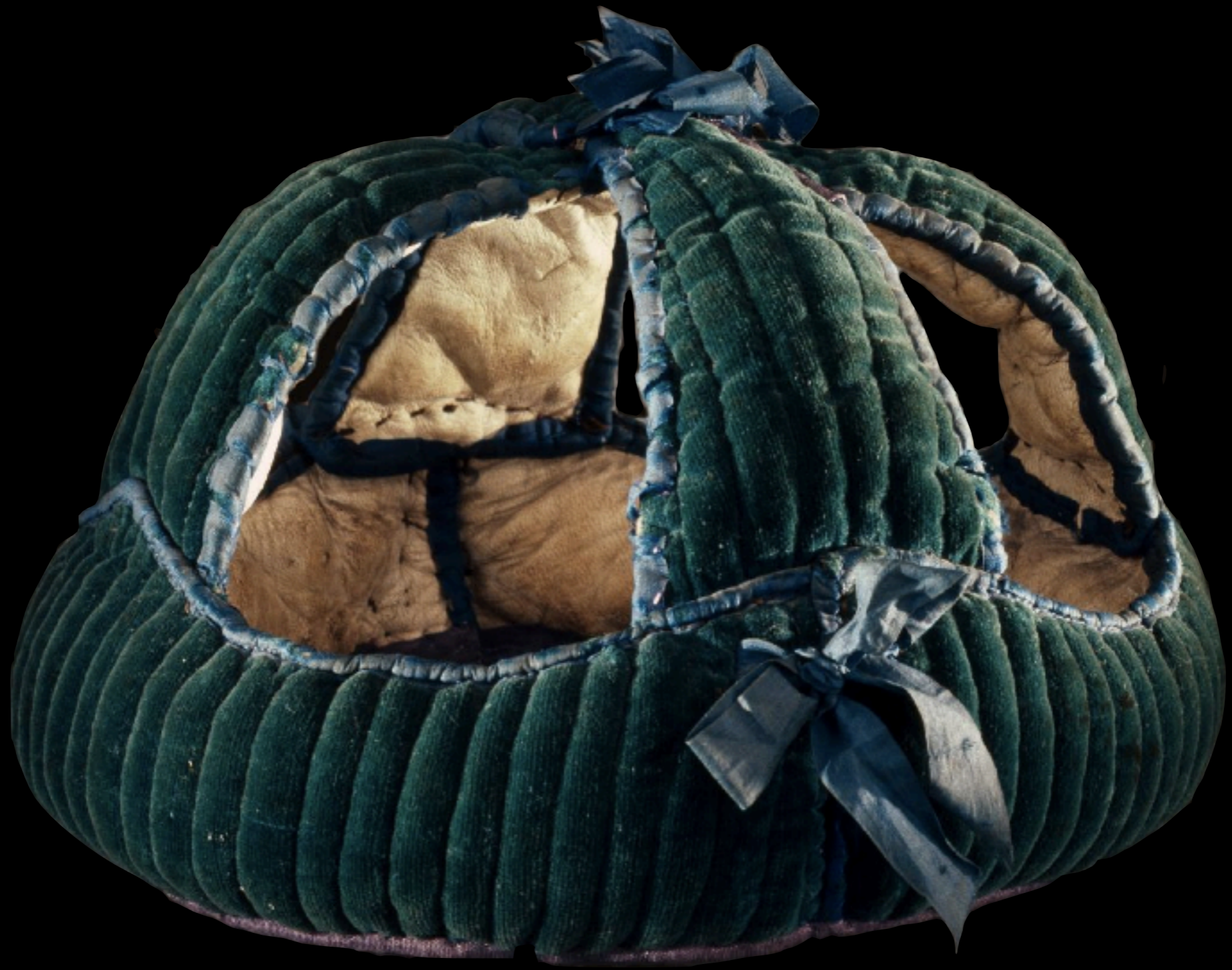
Child's "Pudding" Cap Cotton Velvet Lined with Leather and Bound with Silk, Stuffed with Horsehair c. 1770 - 1785 (Colonial Williamsburg)