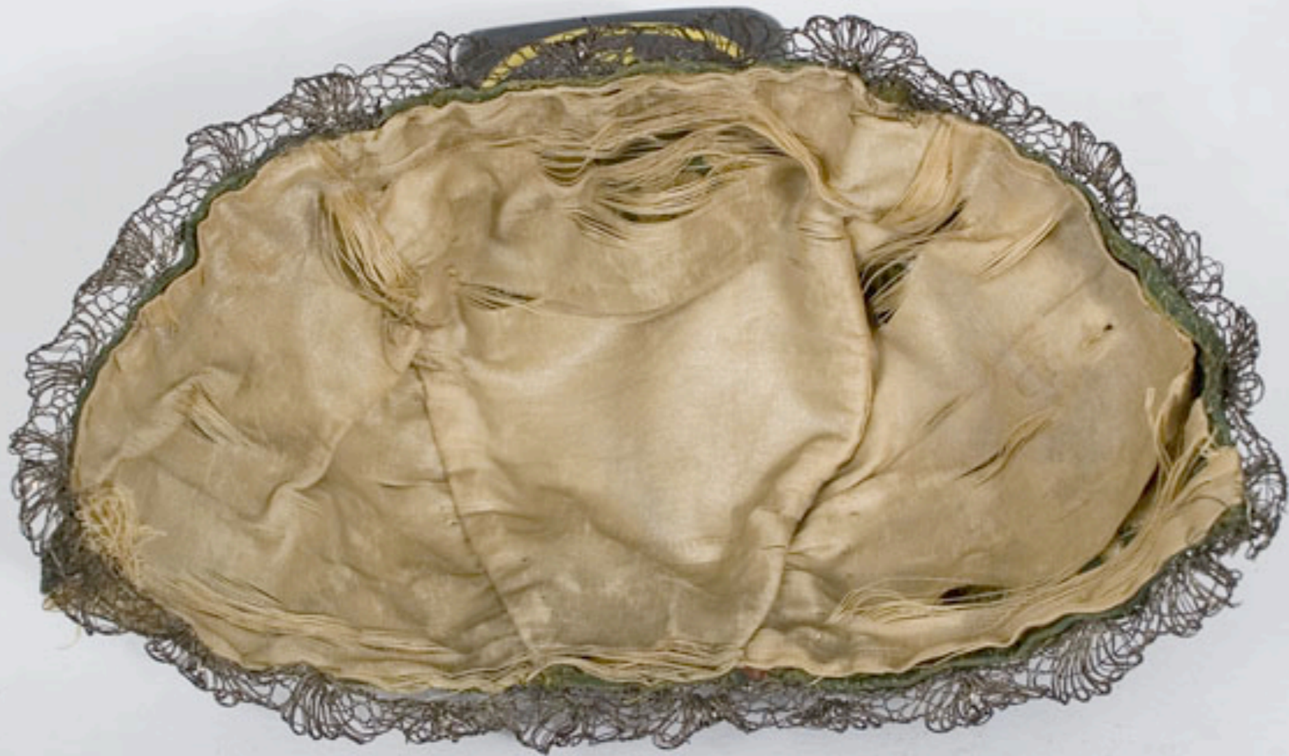
French Style Child's Embroidered Cap c. 1720 (Private Collection)