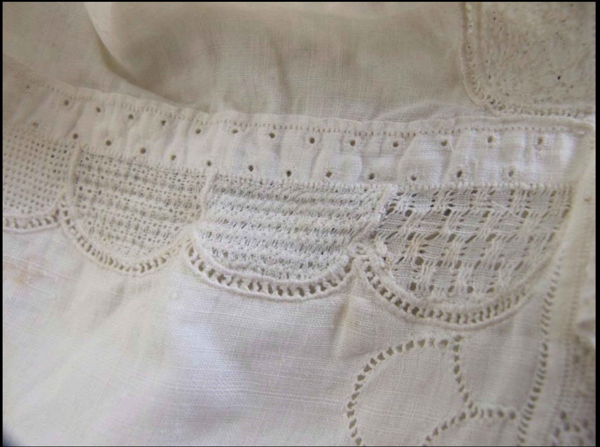
American Infant's Cap - "Glory be to thee O'Lord, 1753"