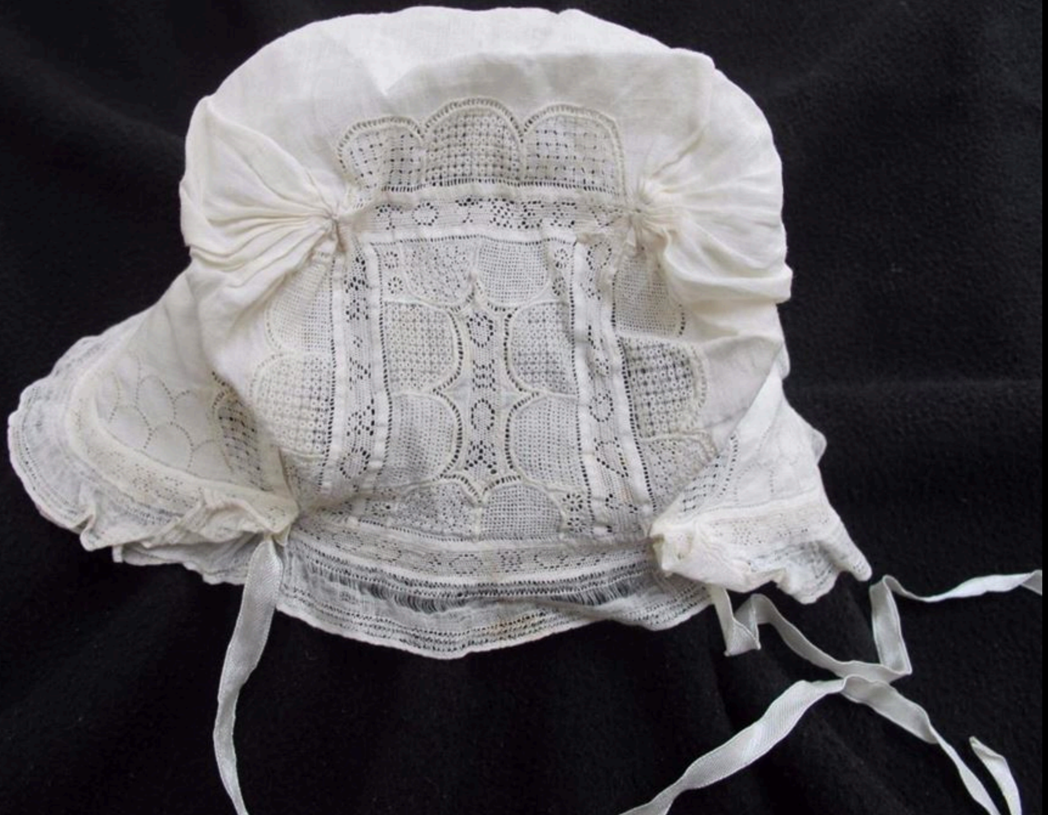
American Infant's Cap - "Glory be to thee O'Lord, 1753"