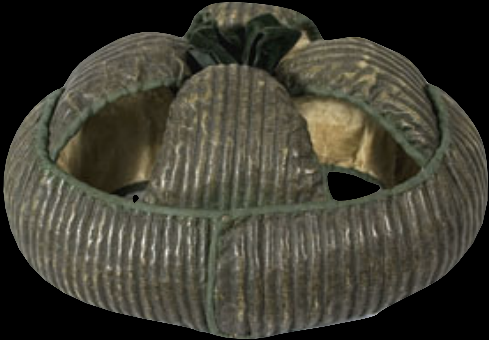
Child's "Pudding" Cap of Glazed Cotton