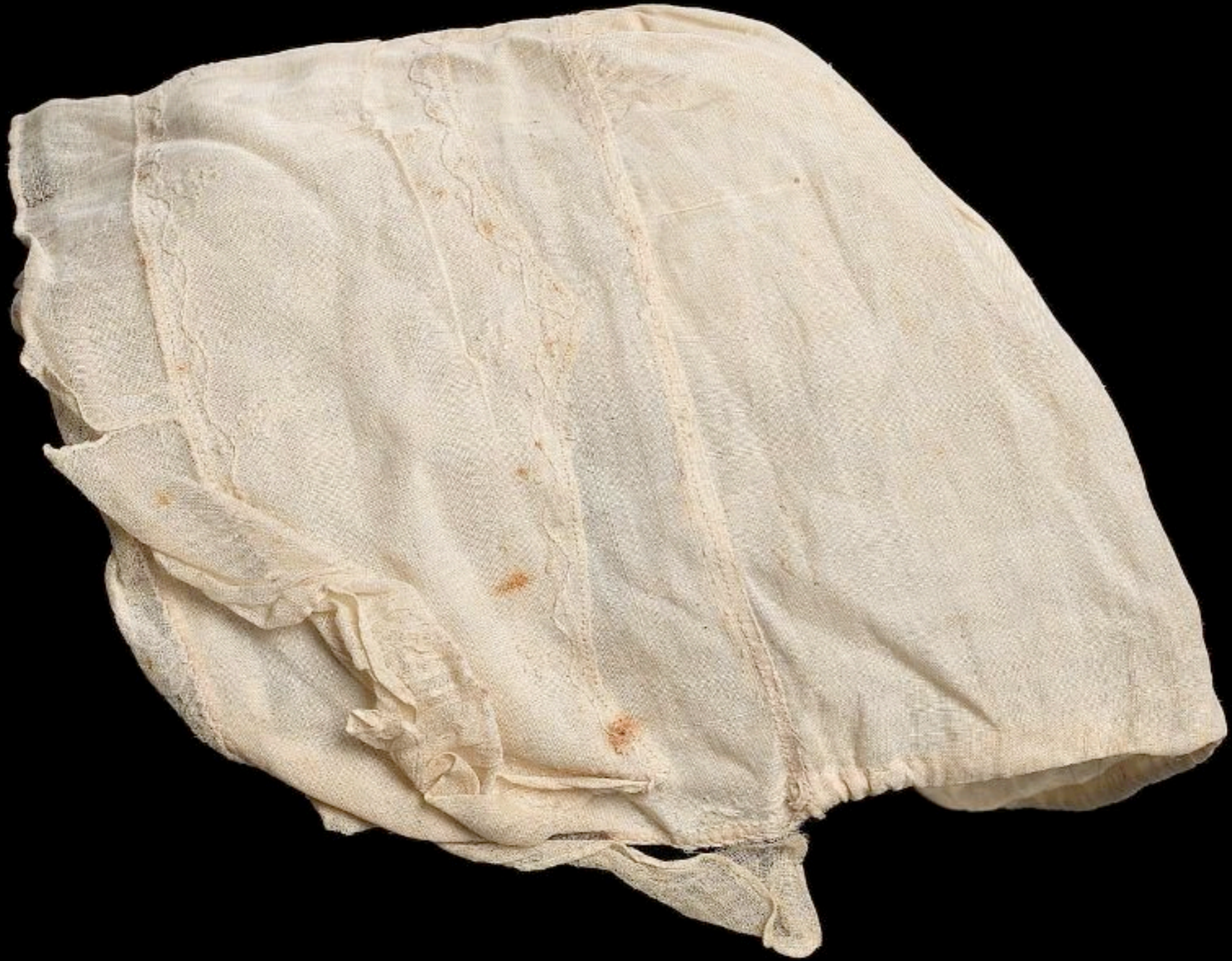
American Infant's Cap 18th Century (Museum of Fine Arts, Boston)