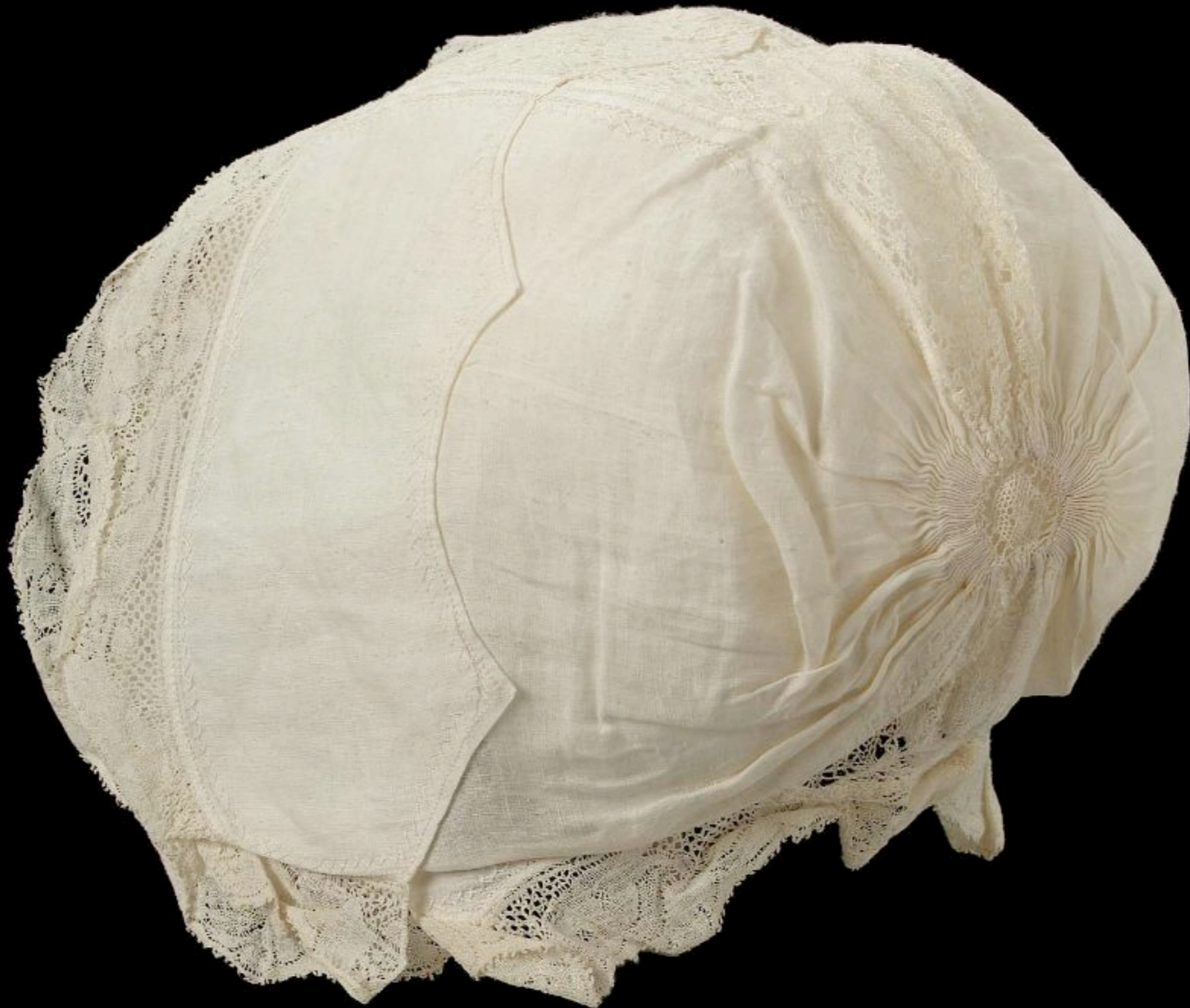
American Infant's Cap Mid 18th Century (Museum of Fine Arts, Boston)