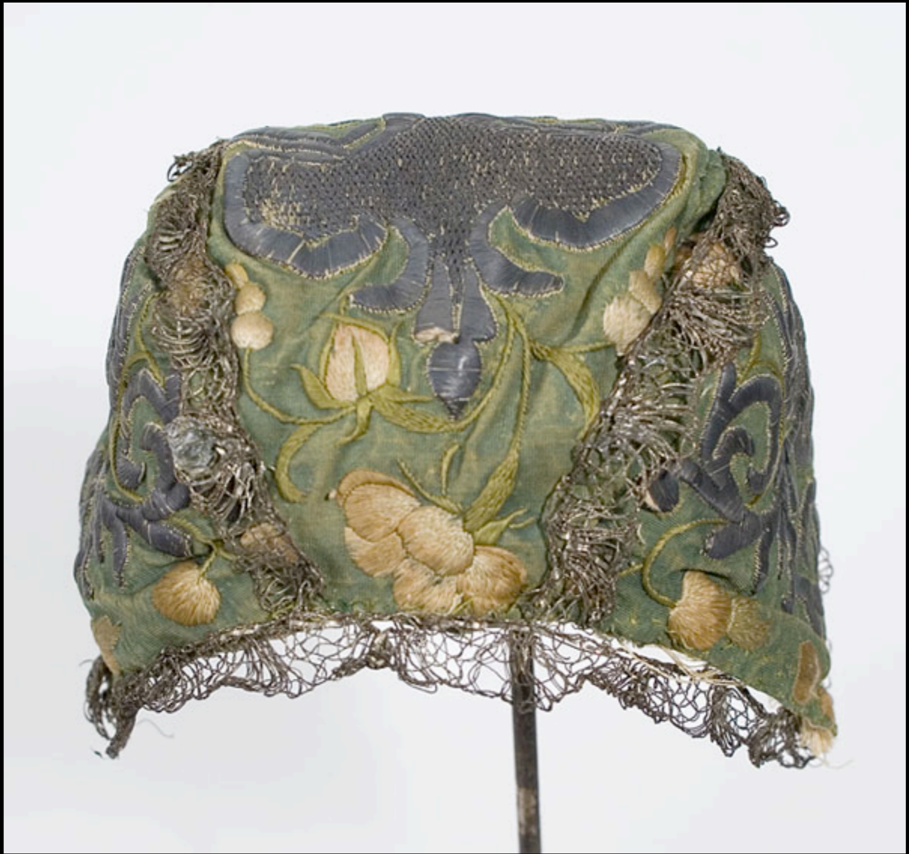
French Style Child's Embroidered Cap c. 1720 (Private Collection)