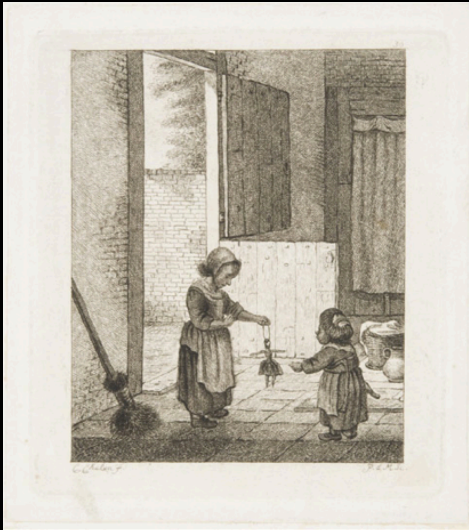
“Two Little Girls with a Toy” Netherlands 1779 (Philadelphia Museum of Art)