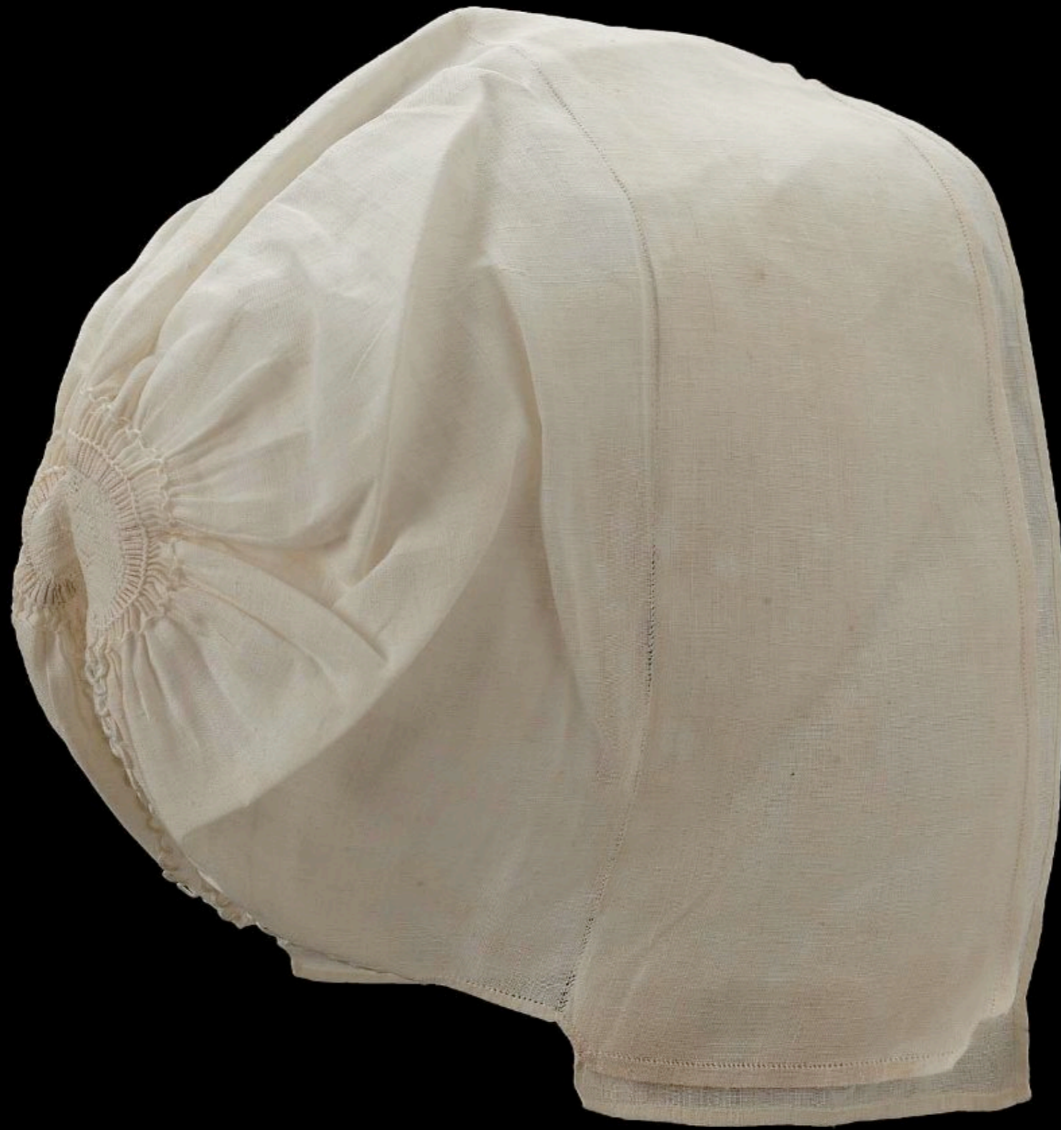
American Infant's Cap 18th Century (Museum of Fine Arts, Boston)