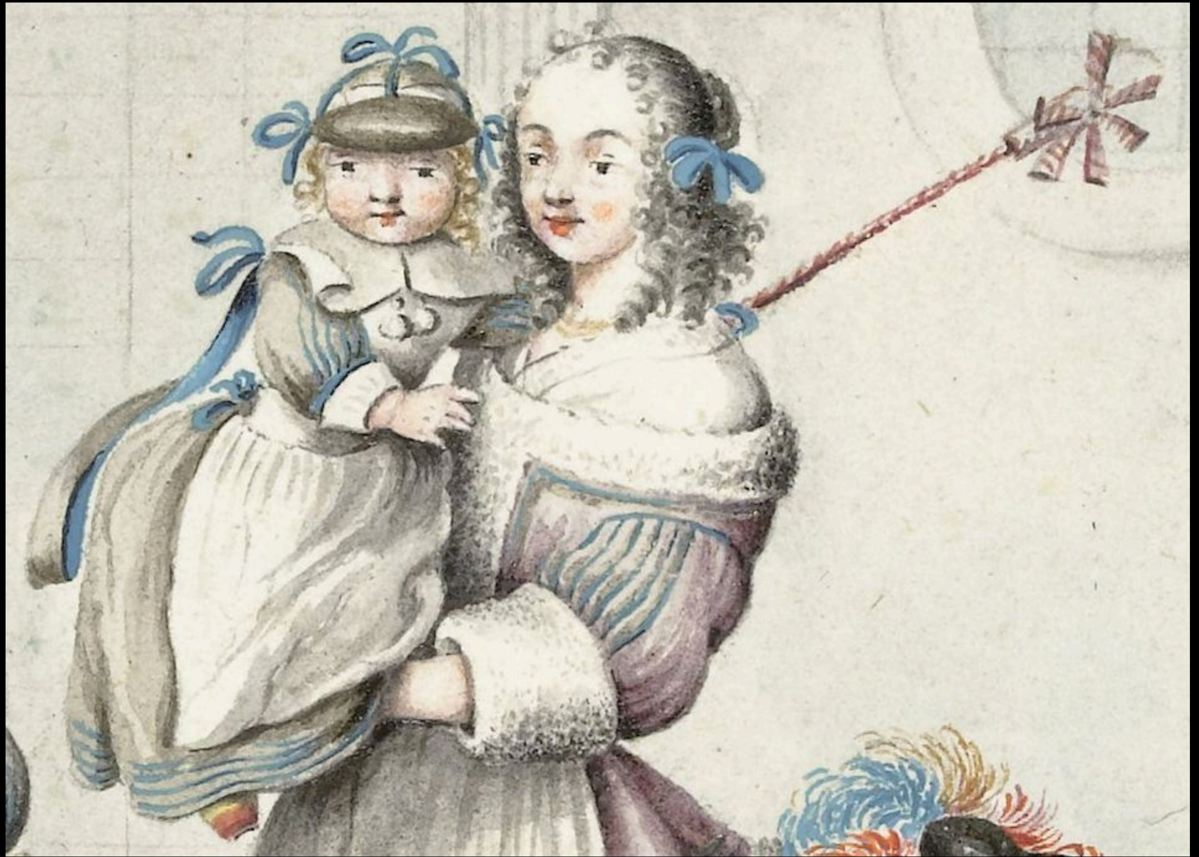
Nursery by Gesina ter Borch c. 1660 - 1661 (Rijksmuseum)