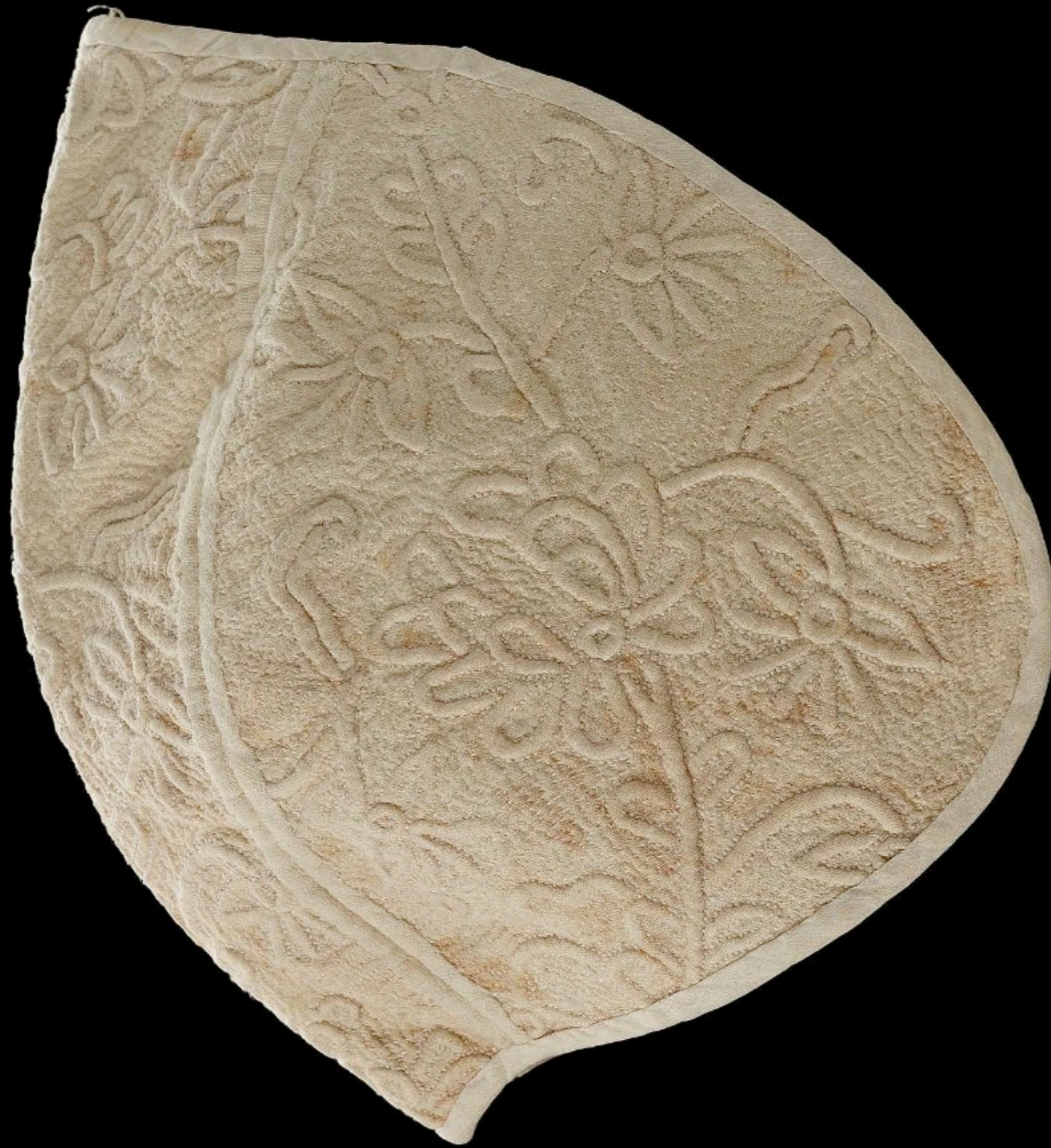
American Linen Infant's Cap Mid 18th Century (Museum of Fine Arts, Boston)