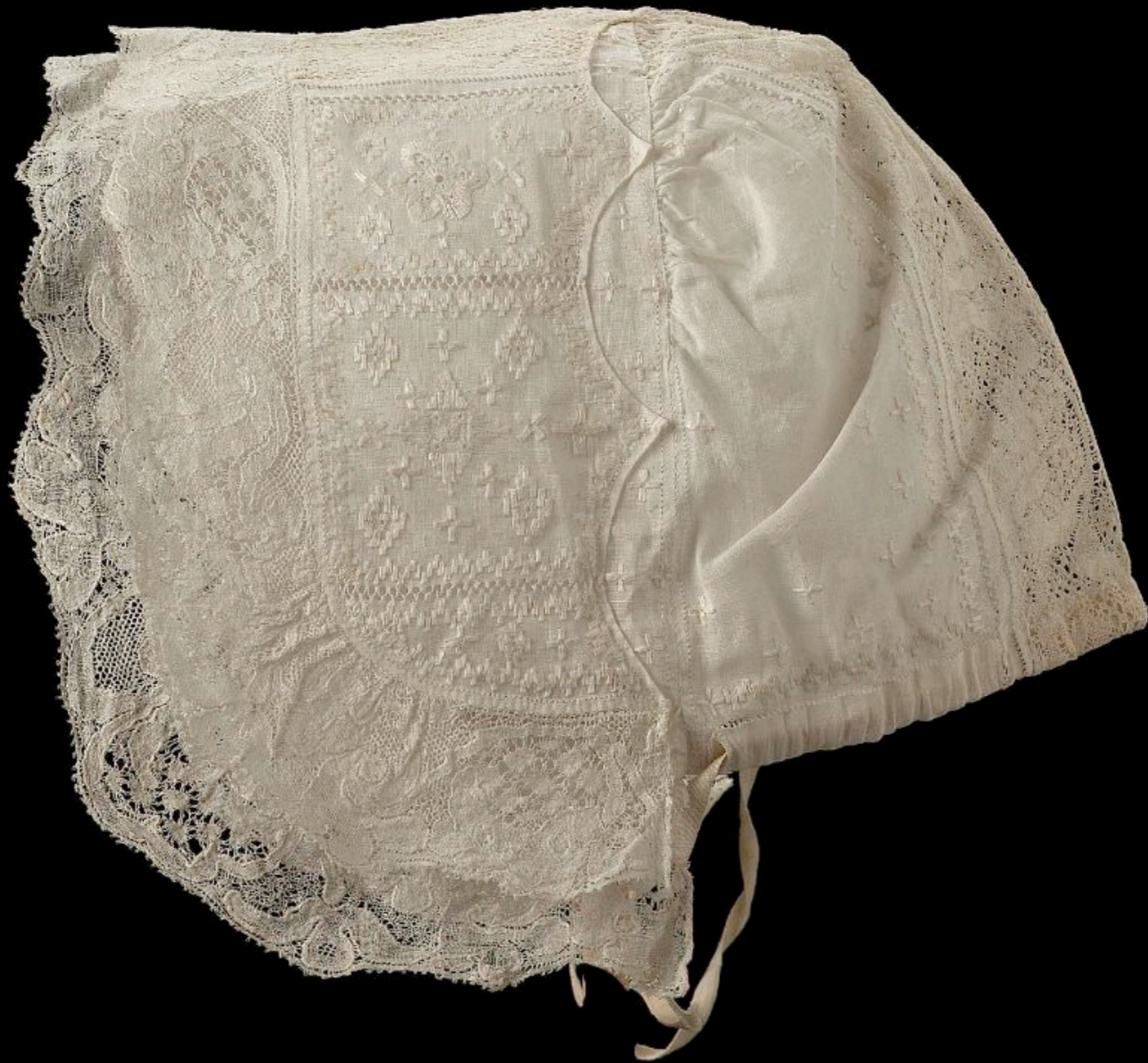
American Infant's Cap 18th Century (Museum of Fine Arts, Boston)