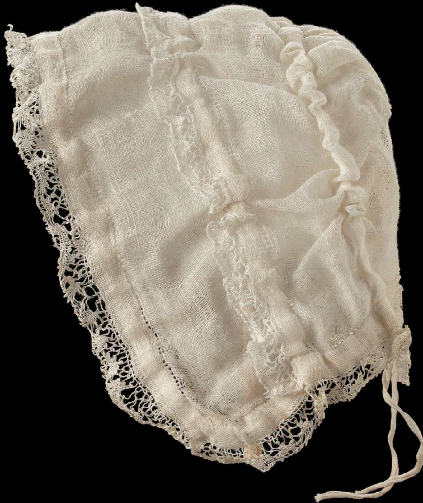
American Infant's Cap 3rd Quarter 18th Century (Museum of Fine Arts, Boston)