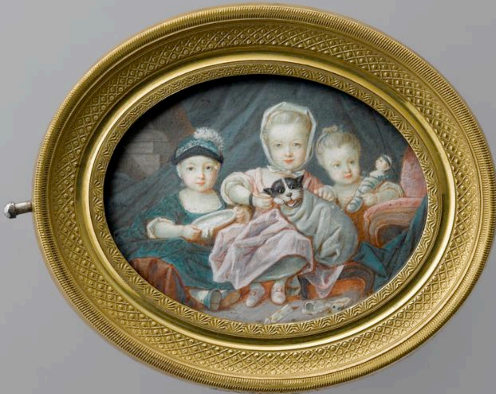
Three Children 18th Century (Private Collection)