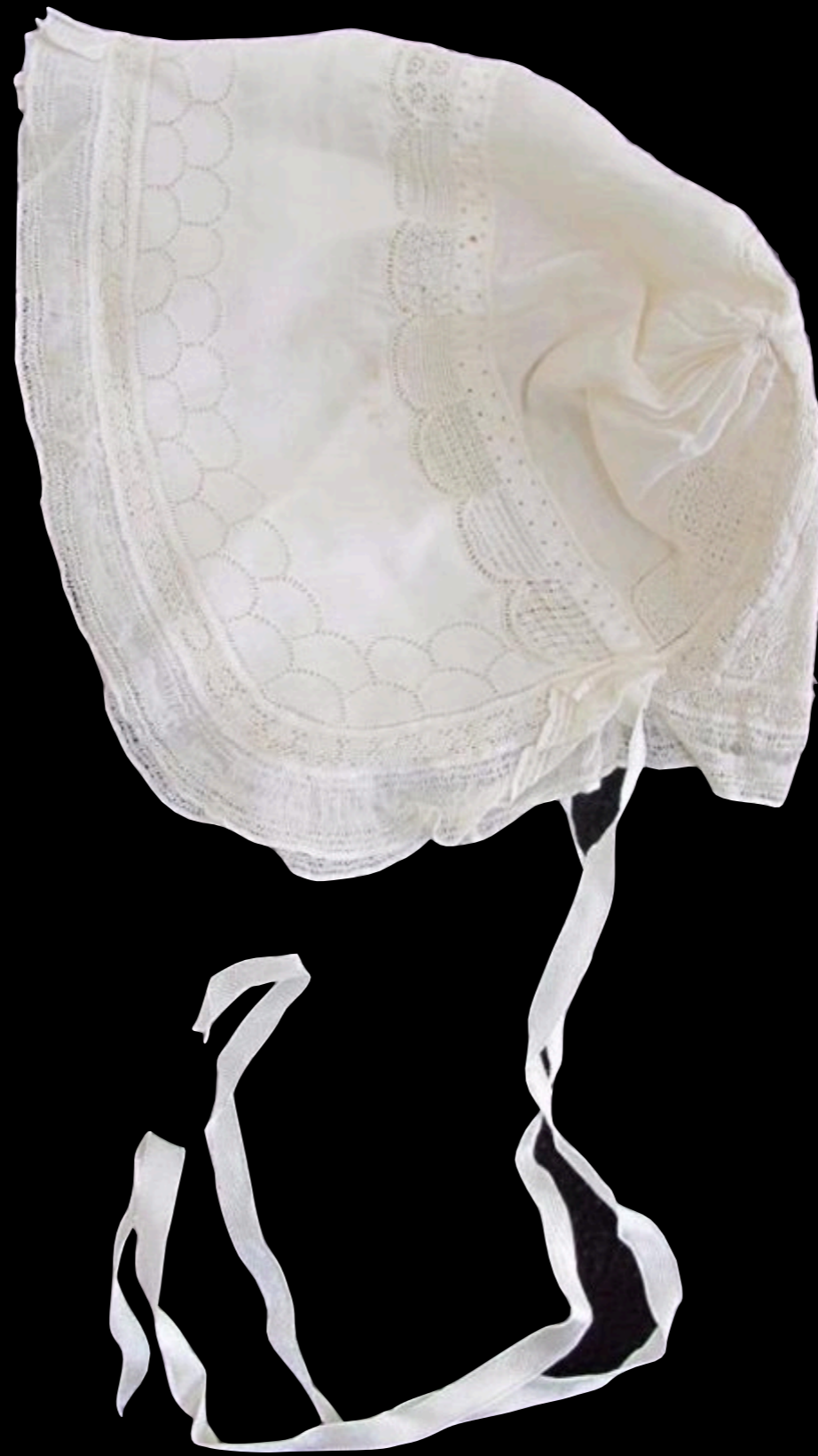
American Infant's Cap - "Glory be to thee O'Lord, 1753"