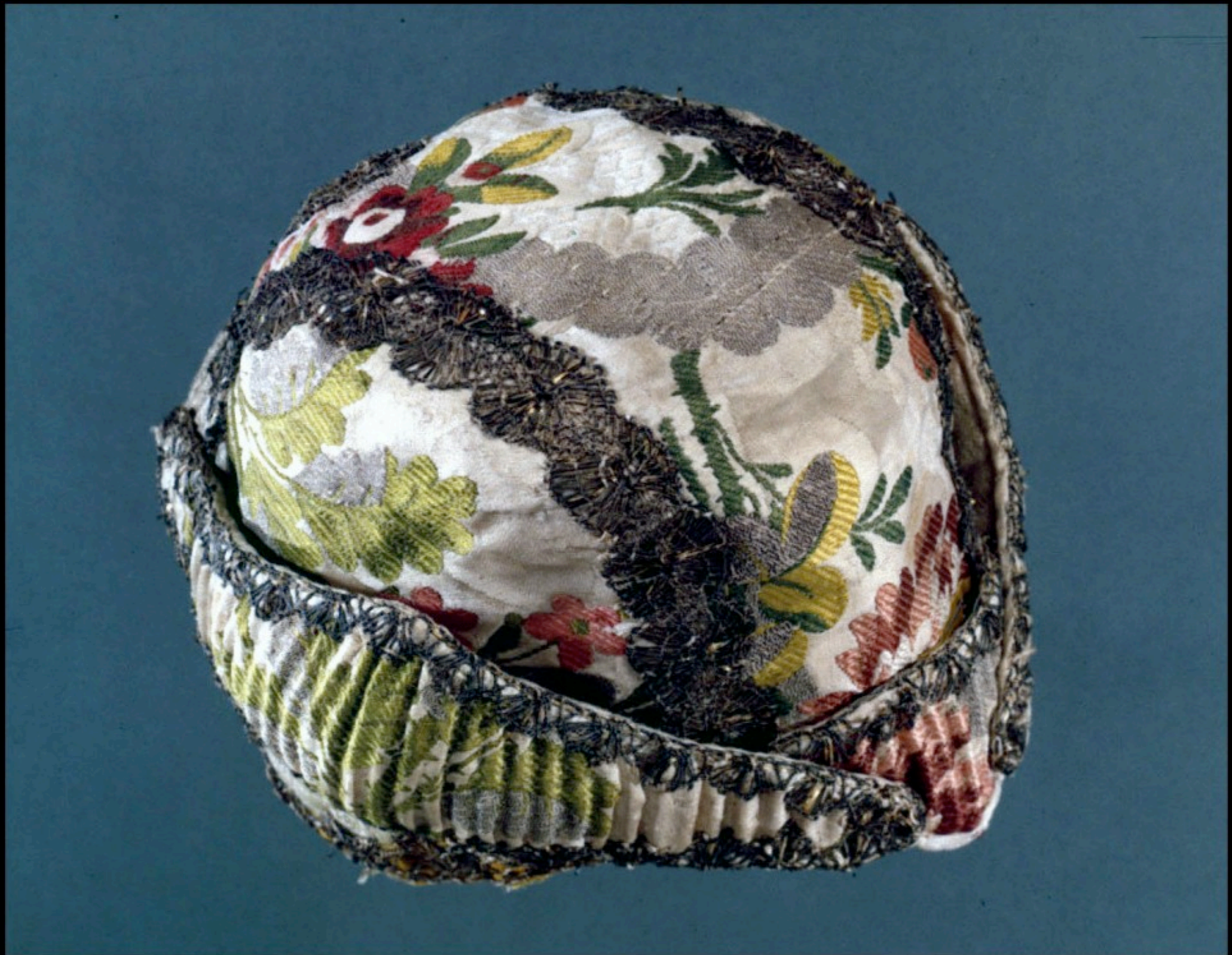
French "Pudding" Cap Beige Silk brocaded in Polychrome silk and metallic thread in a floral pattern. Trim of gold metallic lace. Linen lining c. 1730 - 1750 (Colonial Williamsburg)