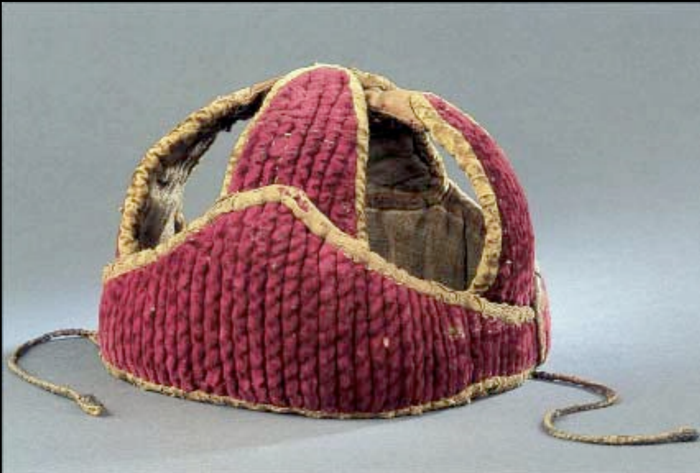
Child's "Pudding" Cap of Silk c. 1775 (Private Collection)