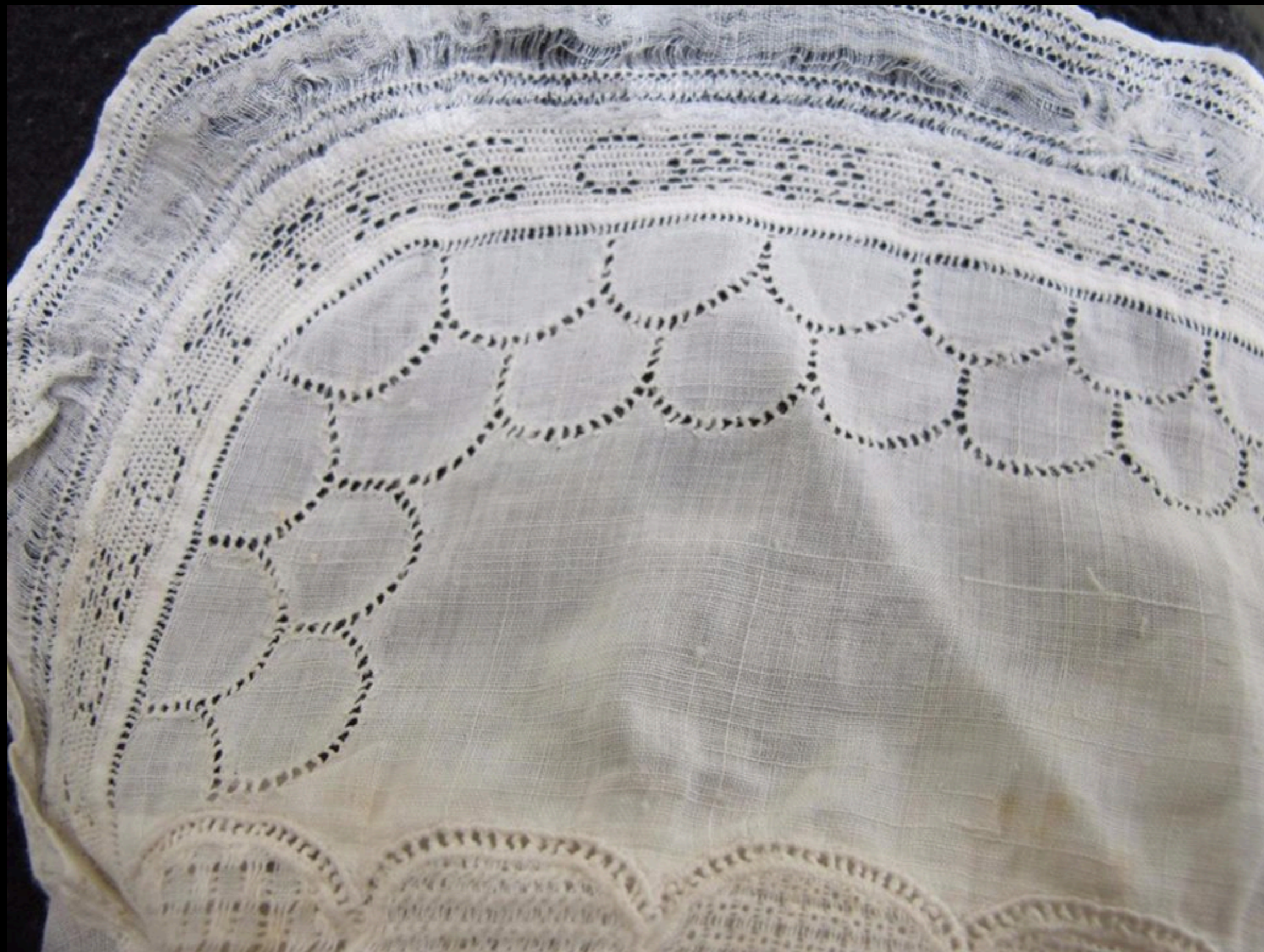
American Infant's Cap - "Glory be to thee O'Lord, 1753"