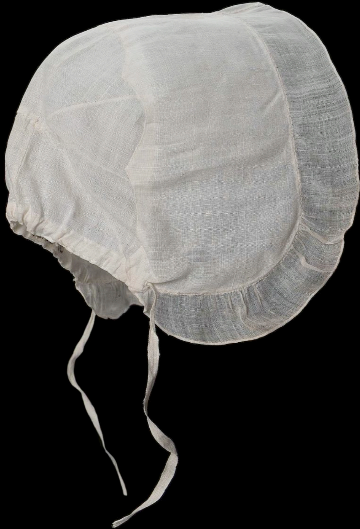
American Infant's Cap Late 18th Century (Museum of Fine Arts, Boston)