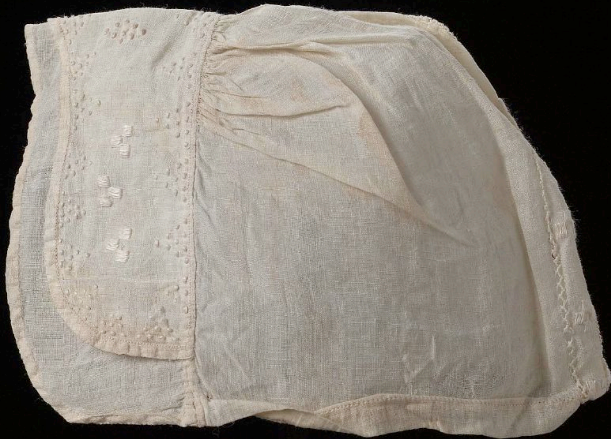
American Infant's Cap 18th Century (Museum of Fine Arts, Boston)