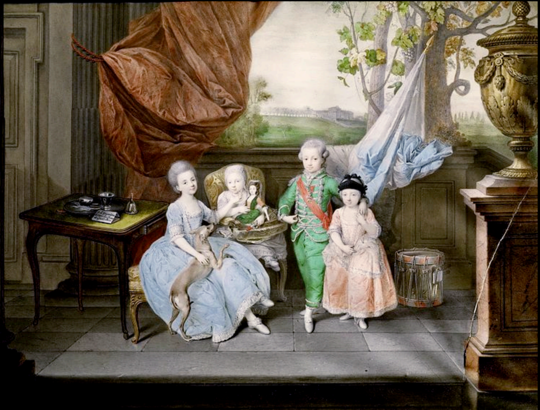
The Children of Ferdinand of Parma by Johann Zoffany 1778 (Kunsthistorisches Museum)