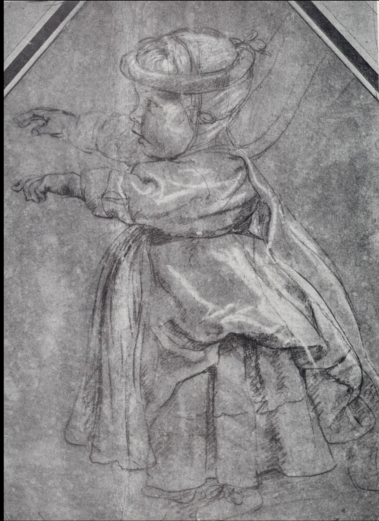
Unknown c. 1620