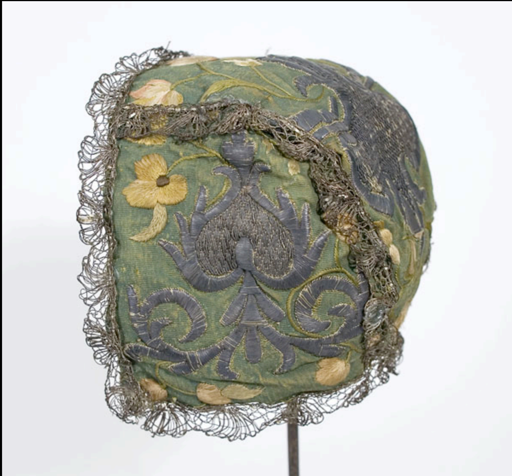
French Style Child's Embroidered Cap