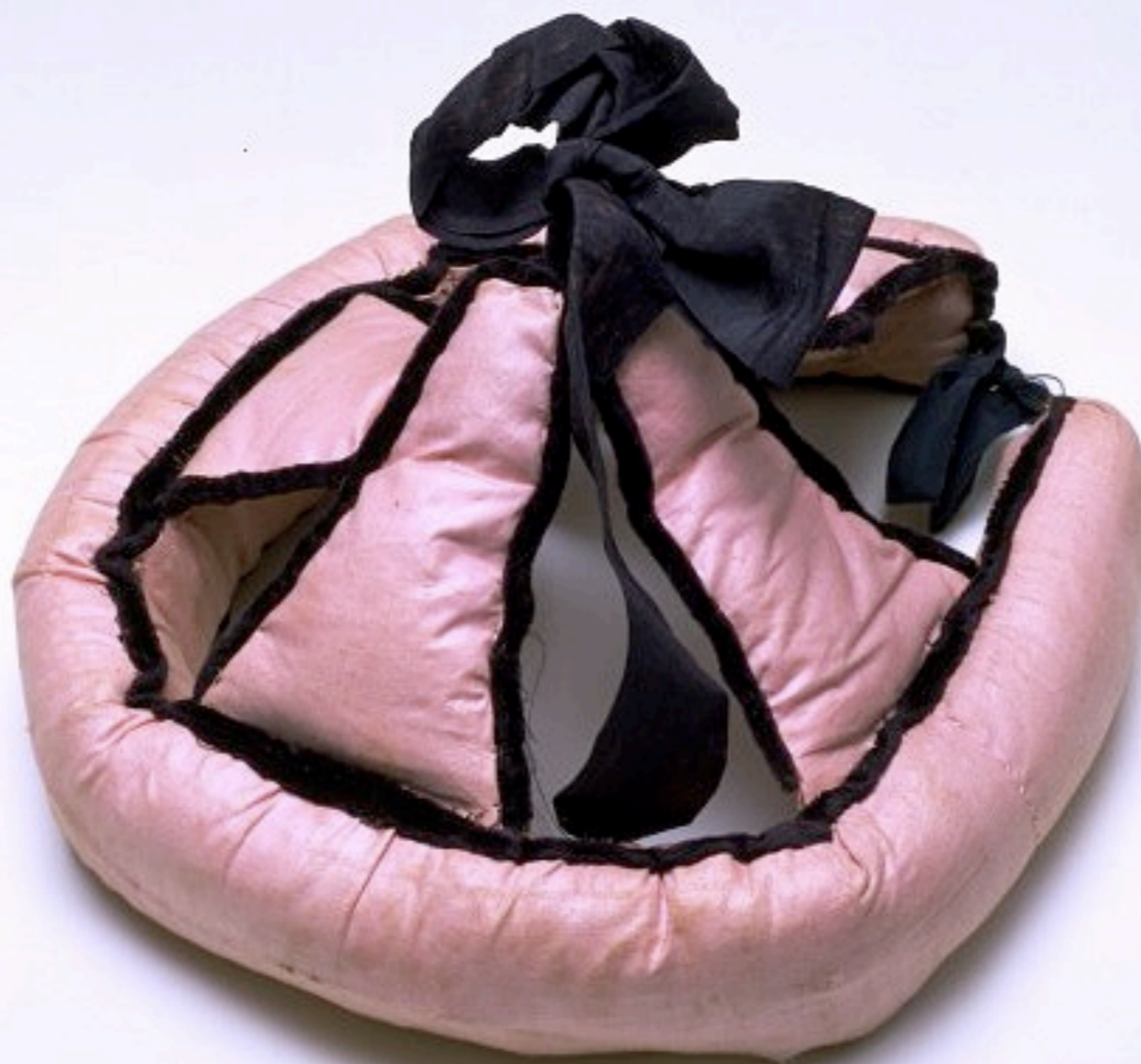
Child's "Pudding" Cap of Glazed Cotton