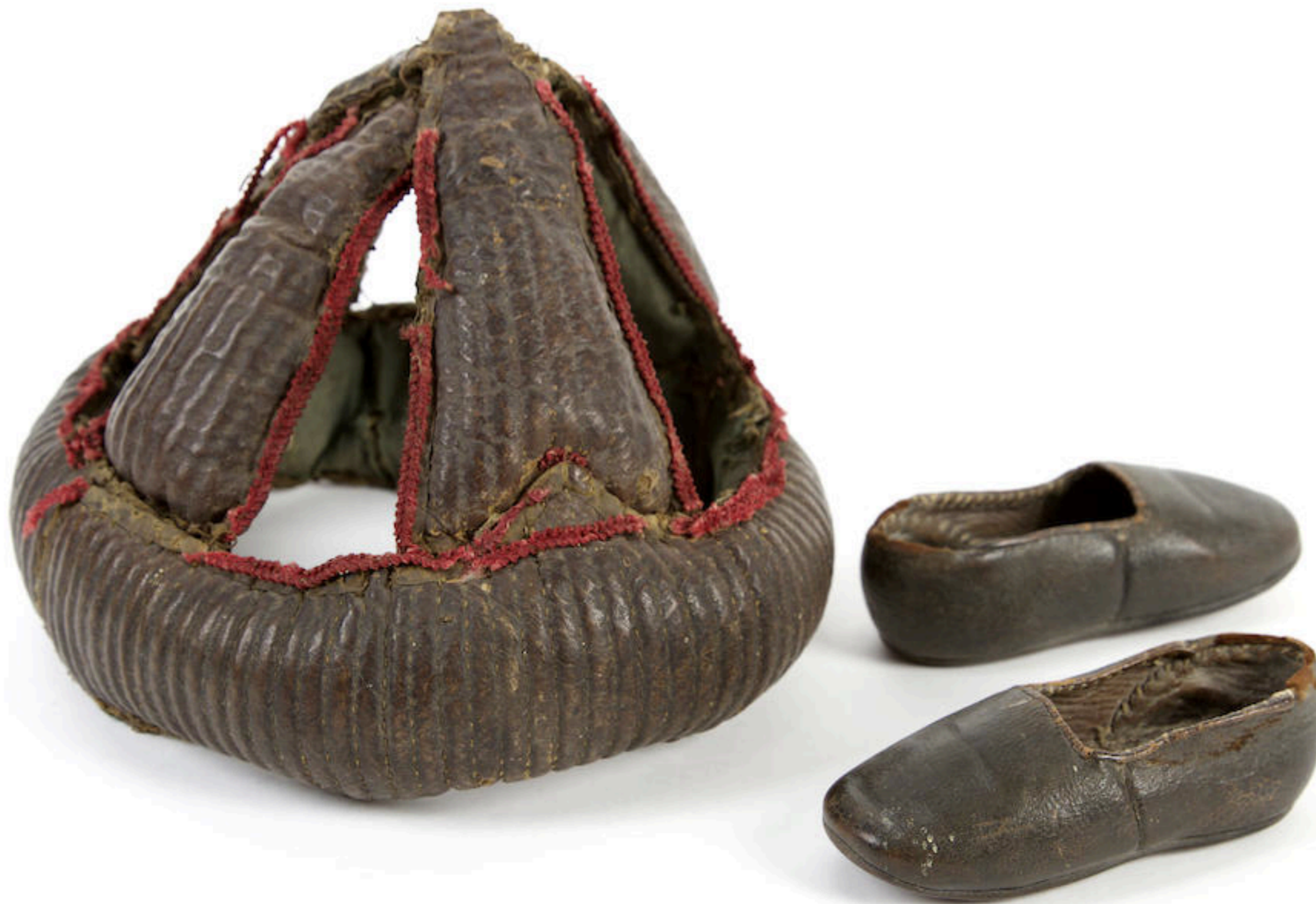
Child's "Pudding" Cap of Ribbed Brown Leather with a Pair of Children's Shoes Late 18th Century (Bonhams)