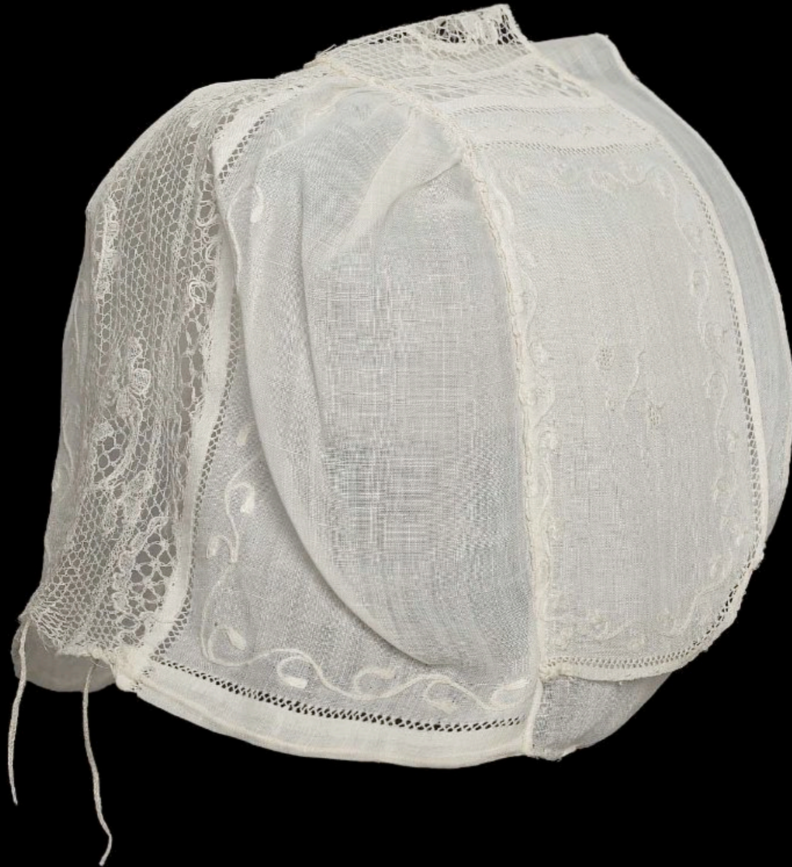
American Infant's Cap 18th Century (Museum of Fine Arts, Boston)