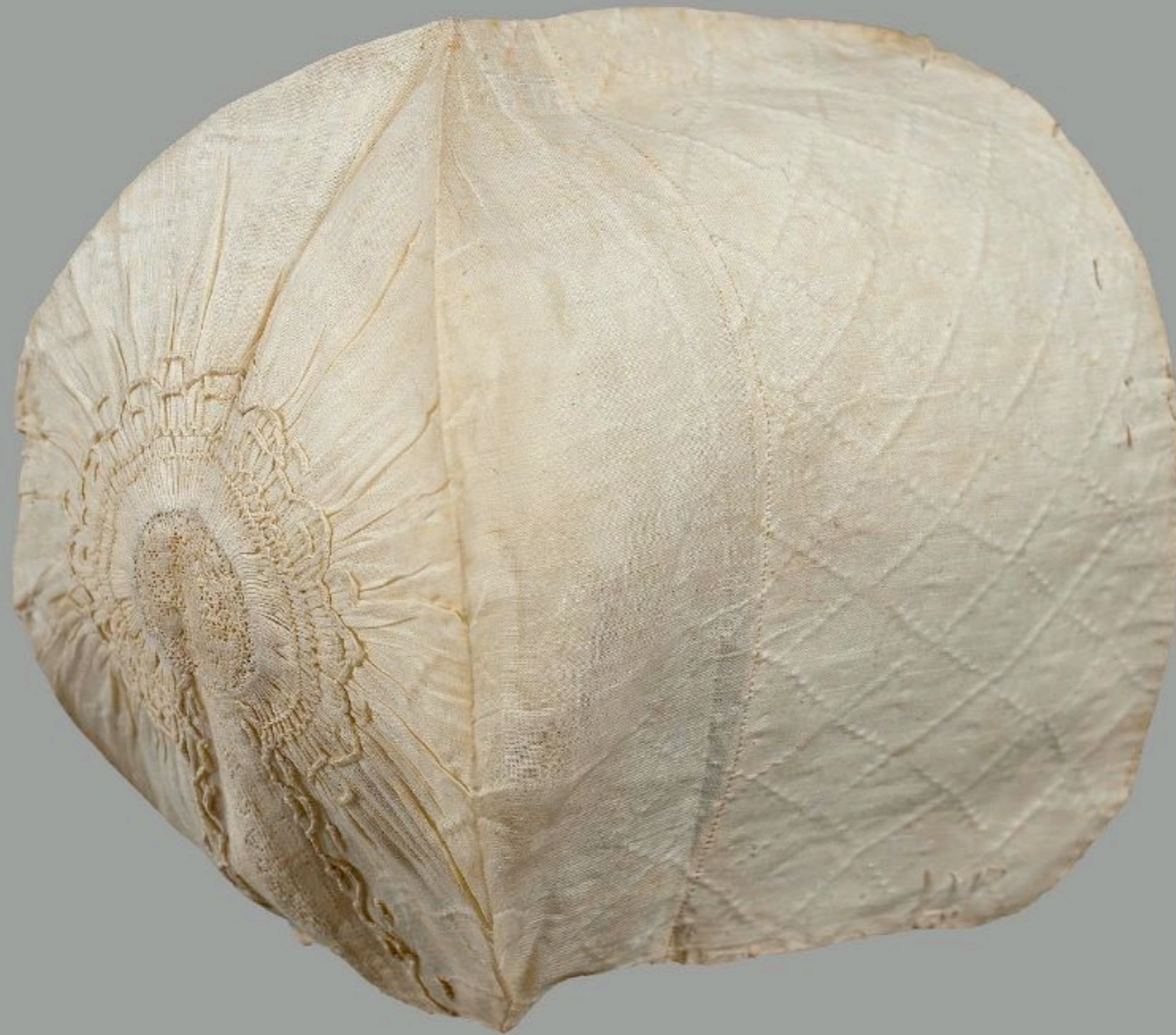
American Infant's Cap 18th Century (Museum of Fine Arts, Boston)