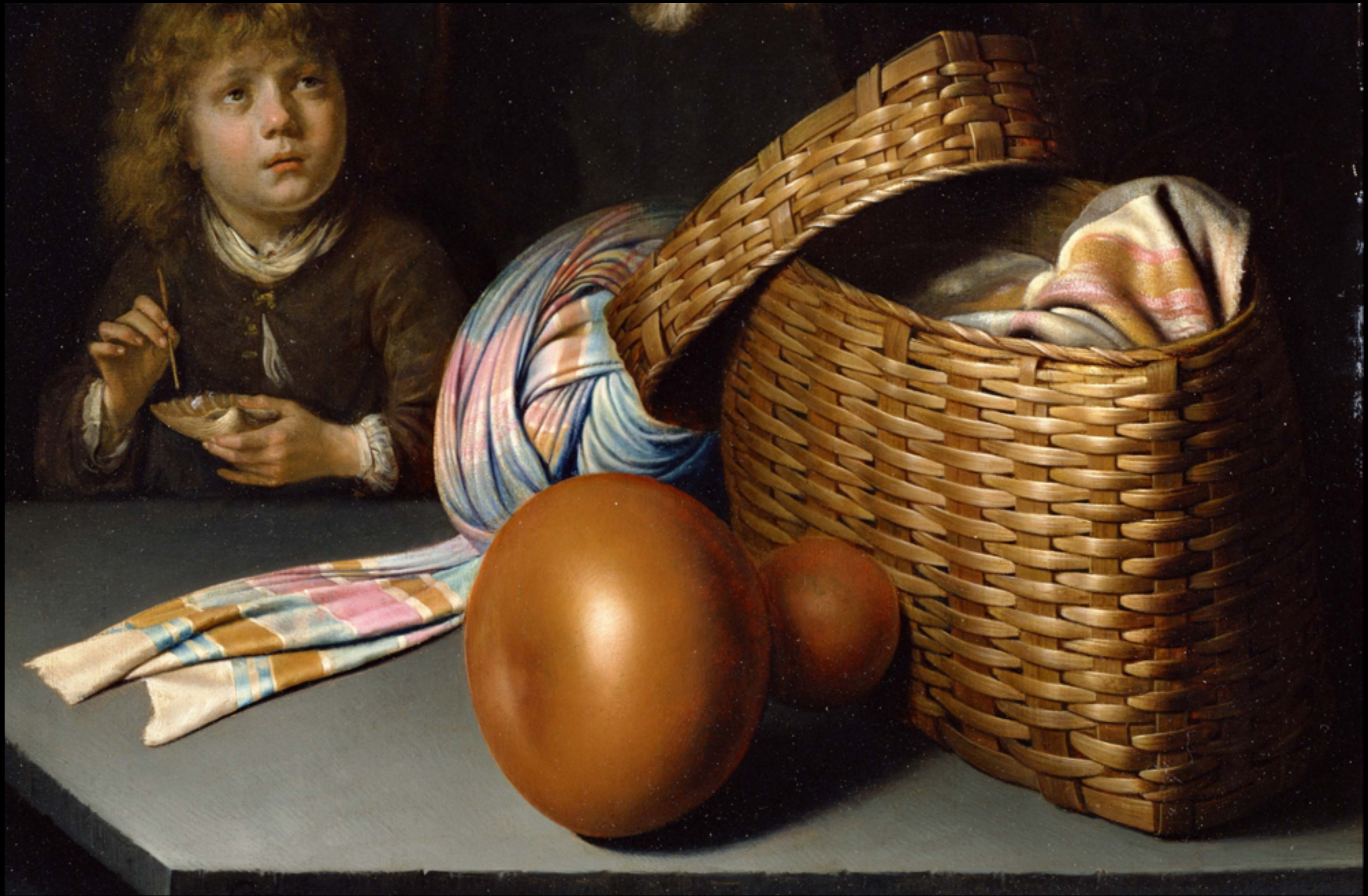
Dutch Boy Blowing Bubbles by Gerrit Dou c. 1635 - 1636 (National Museum of Western Art)