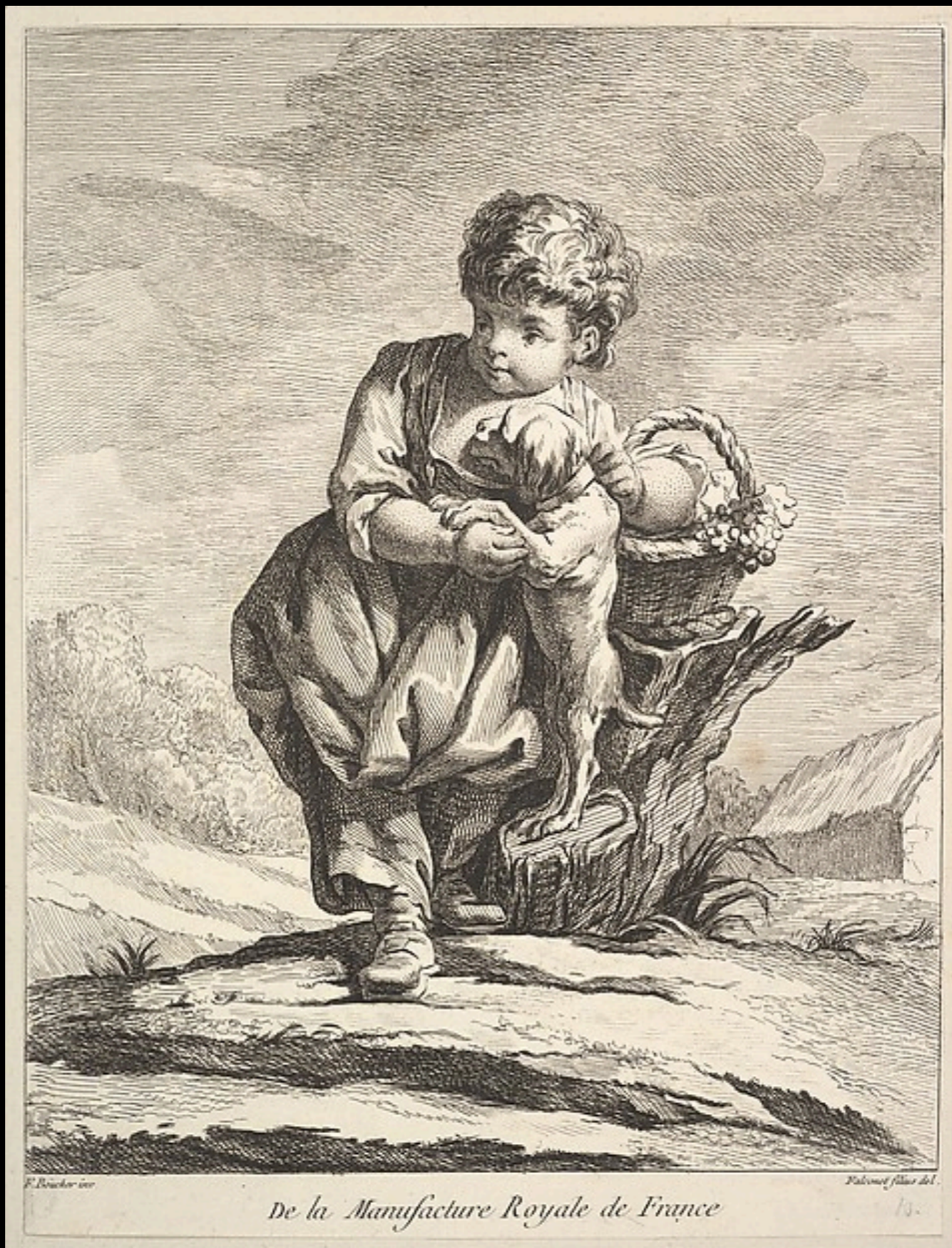
De La Manufacture Royale de France by Pierre Etienne Falconet after François Boucher 1757 (Metropolitan Museum of Art)