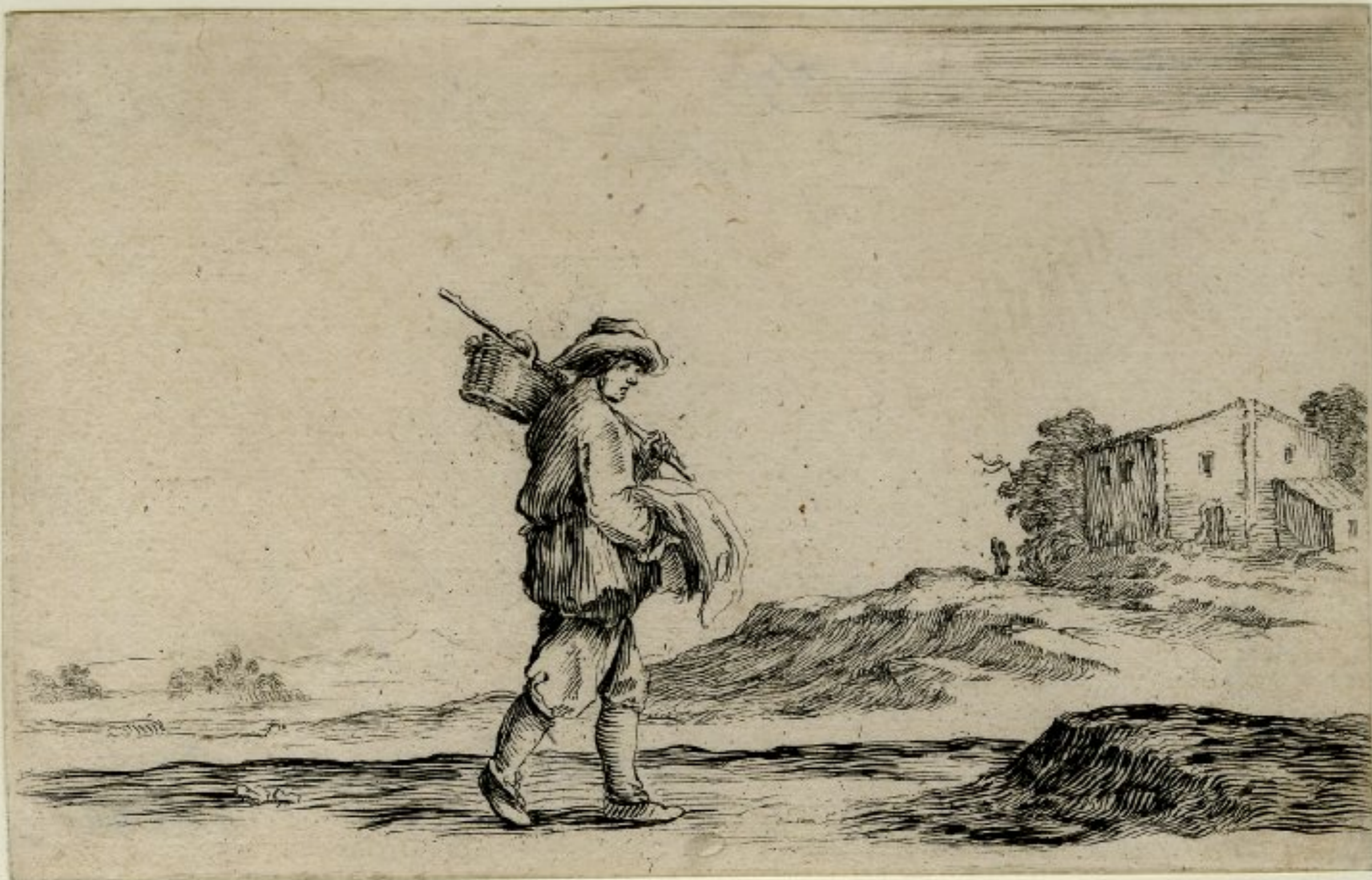
Prince Rupert of the Rhine with a Wicker Basket after Stefano della Bella c. 1646+ (The British Museum)