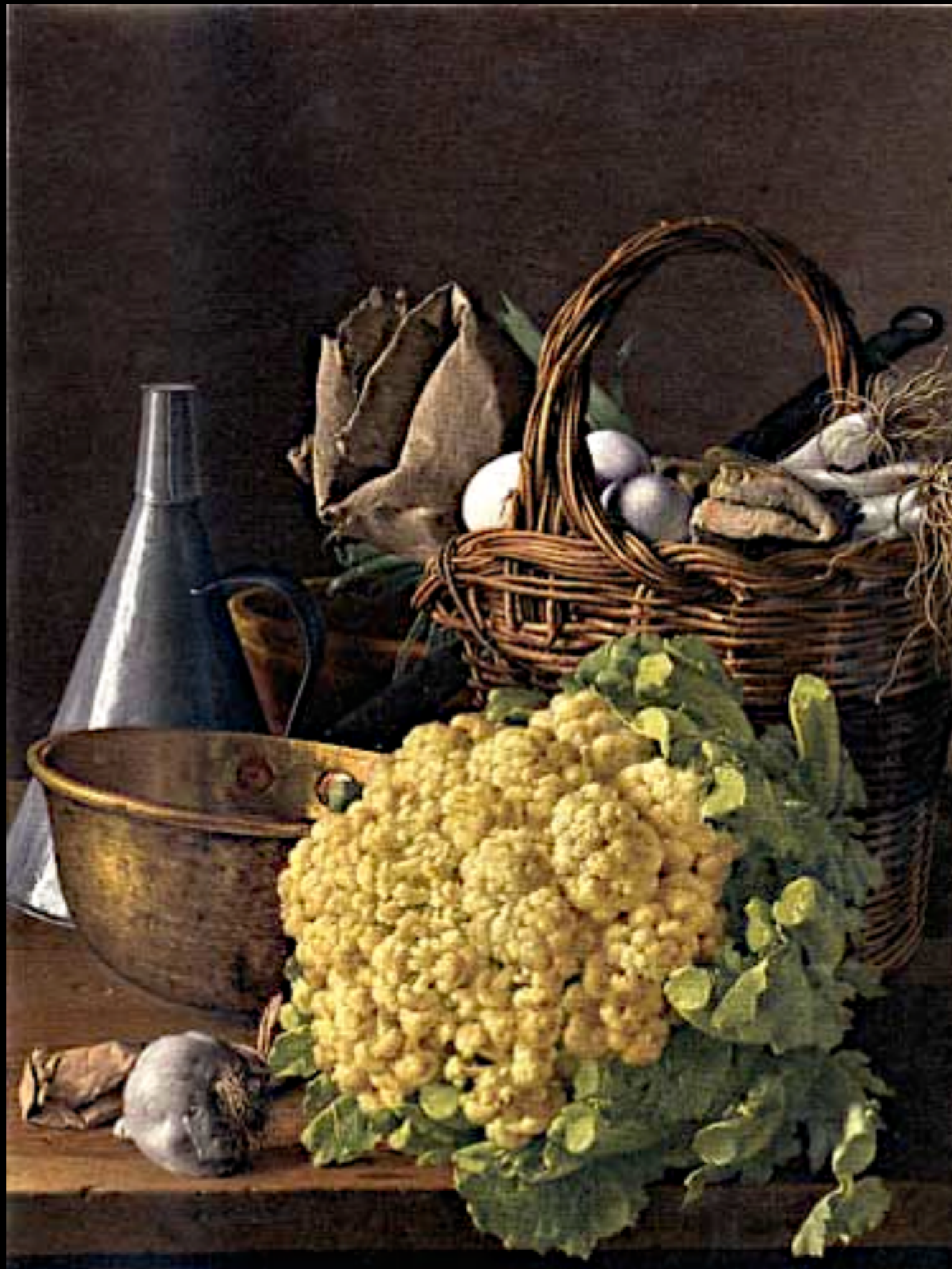
Spanish Still Life Showing a Wicker Basket by Luis Mendez Late 18th Century (Private Collection)