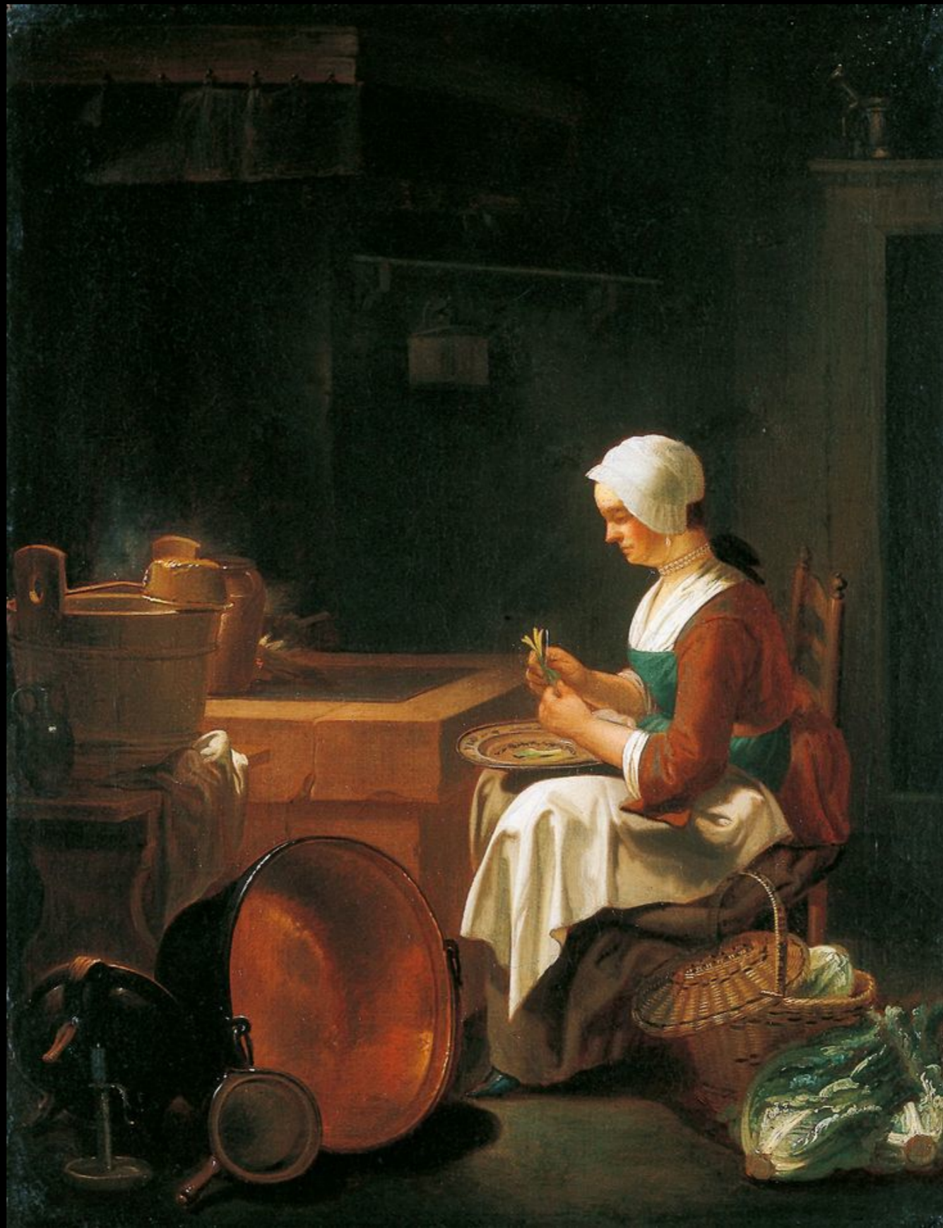
The Maid in the Kitchen - Showing a Lidded Wicker Basket by Justis Junker c. 1730 (Private Collection)