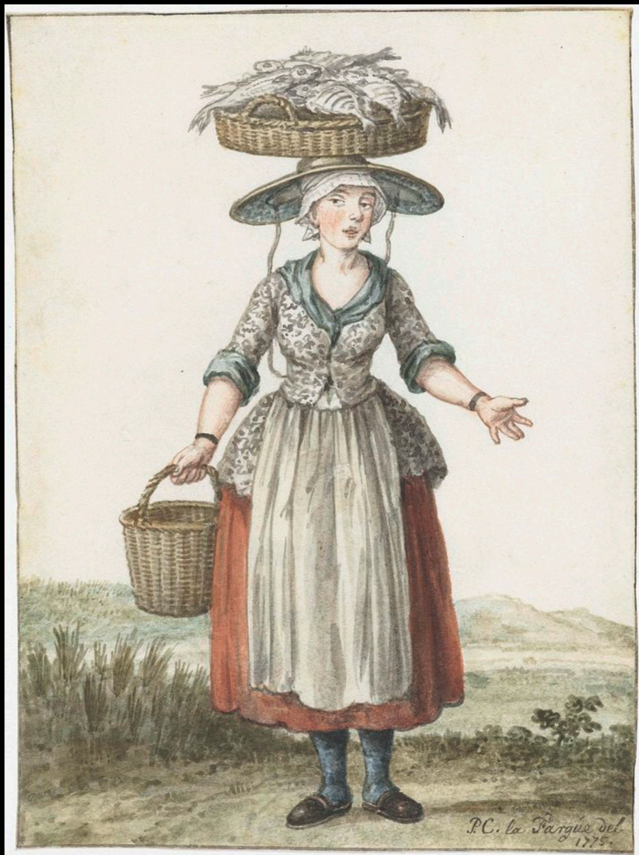
Scheveningse visloopster by Paulus Constantijn la Fargue 1775 (rijk Museum)