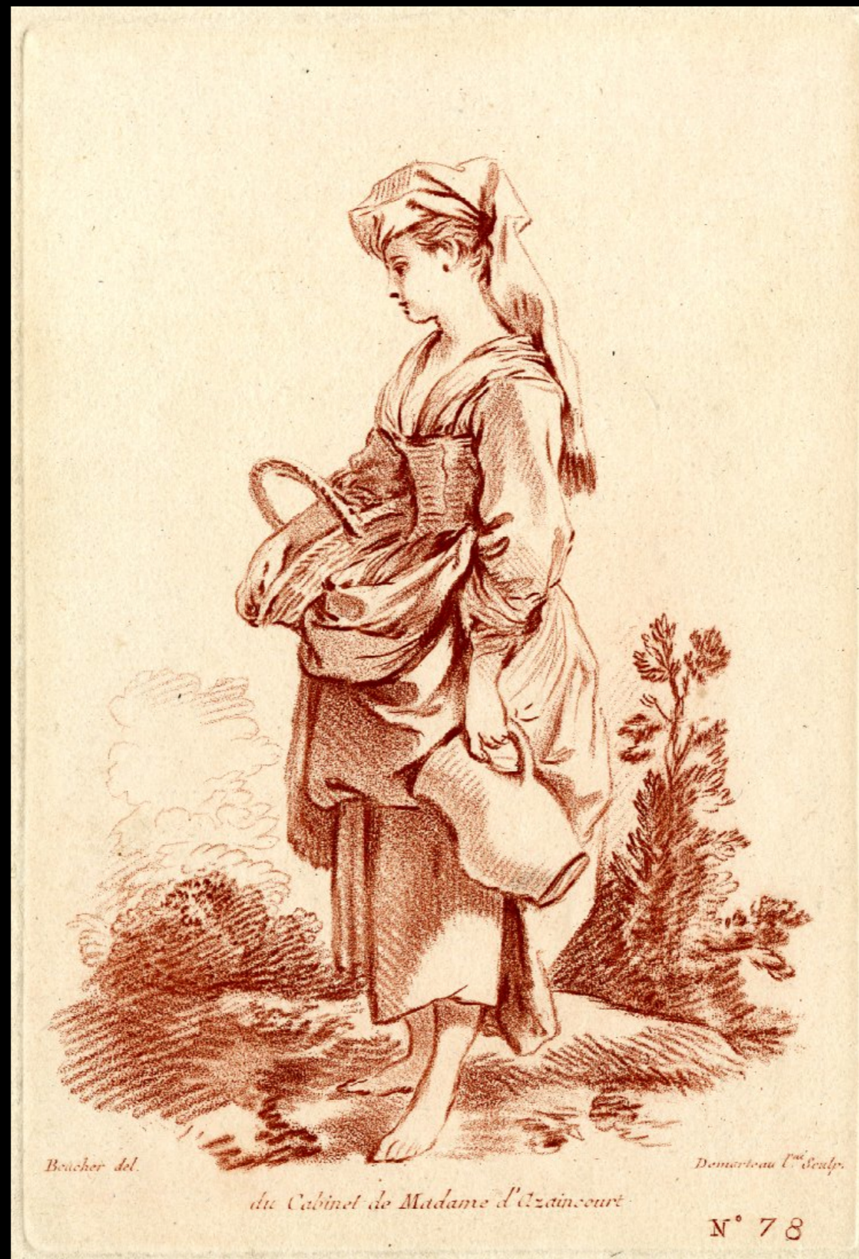
French Peasant with a Wicker Basket by Francois Boucher c. 1756 - 1776 (The British Museum)