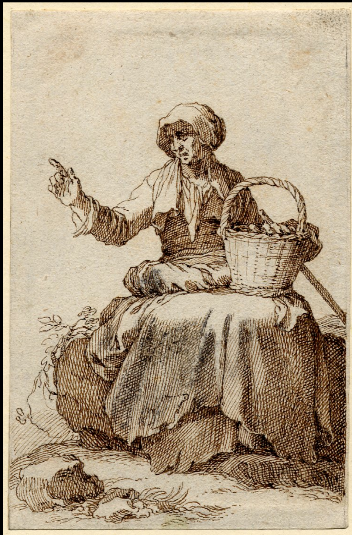
A Dutch Peasant Woman with a Wicker Basket by Abraham Bloemaert c. 1600 - 1651 (The British Museum)