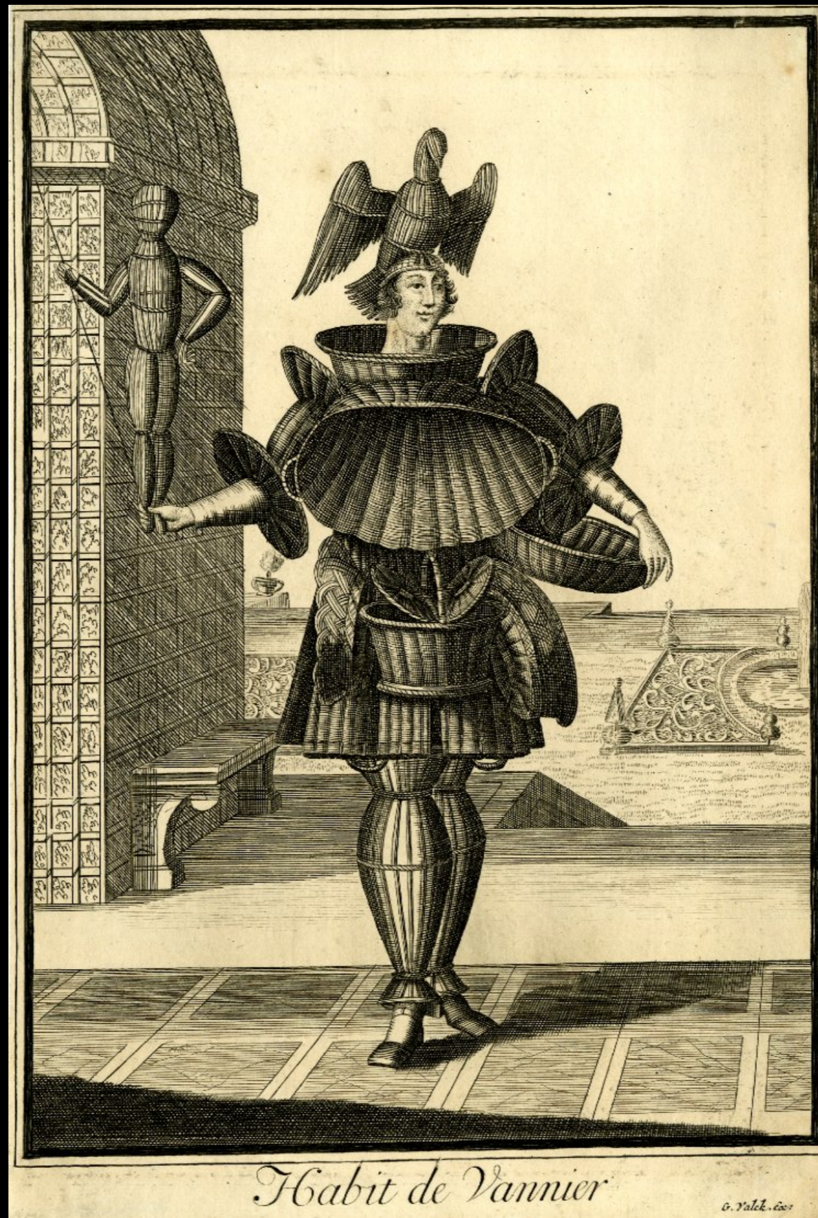
Habit de Vannier

Travestissements / Habit de Vannier (Dutch) by Gerald Valck after Nicolas de Larmessin II c. 1695 - 1720 (The British Museum)