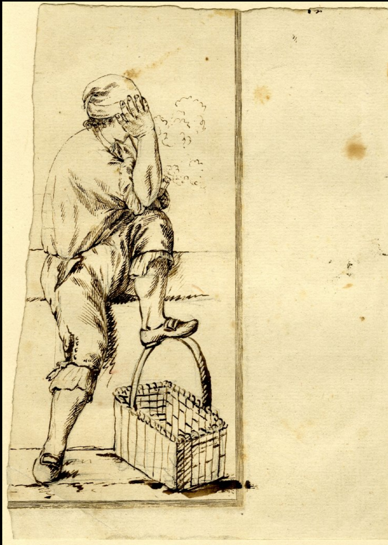
A German with a Basket Late 17th Century (The British Museum)