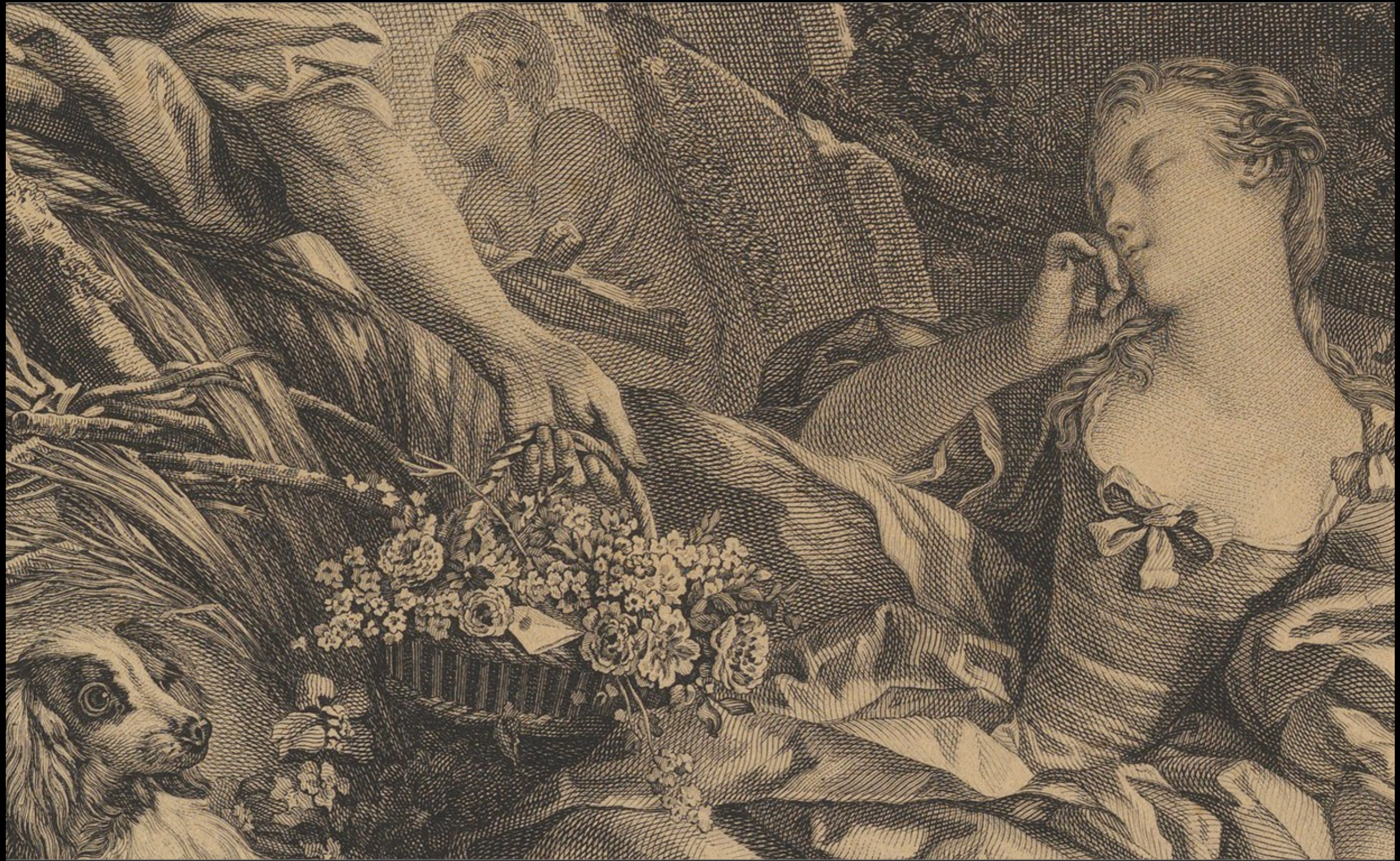
“LE PANIER MISTERIEUX” (The Mysterious Basket) by René Gaillard after François Boucher c. Mid 18th Century (Metropolitan Museum of Art)