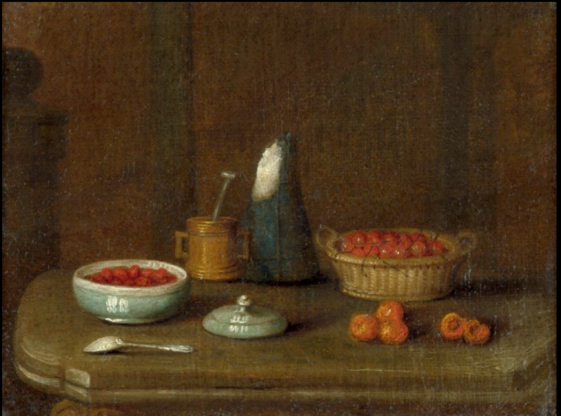
Still Life with Sugar Loaf Wrapped in Blue Paper by Unknown Artist c. 1720