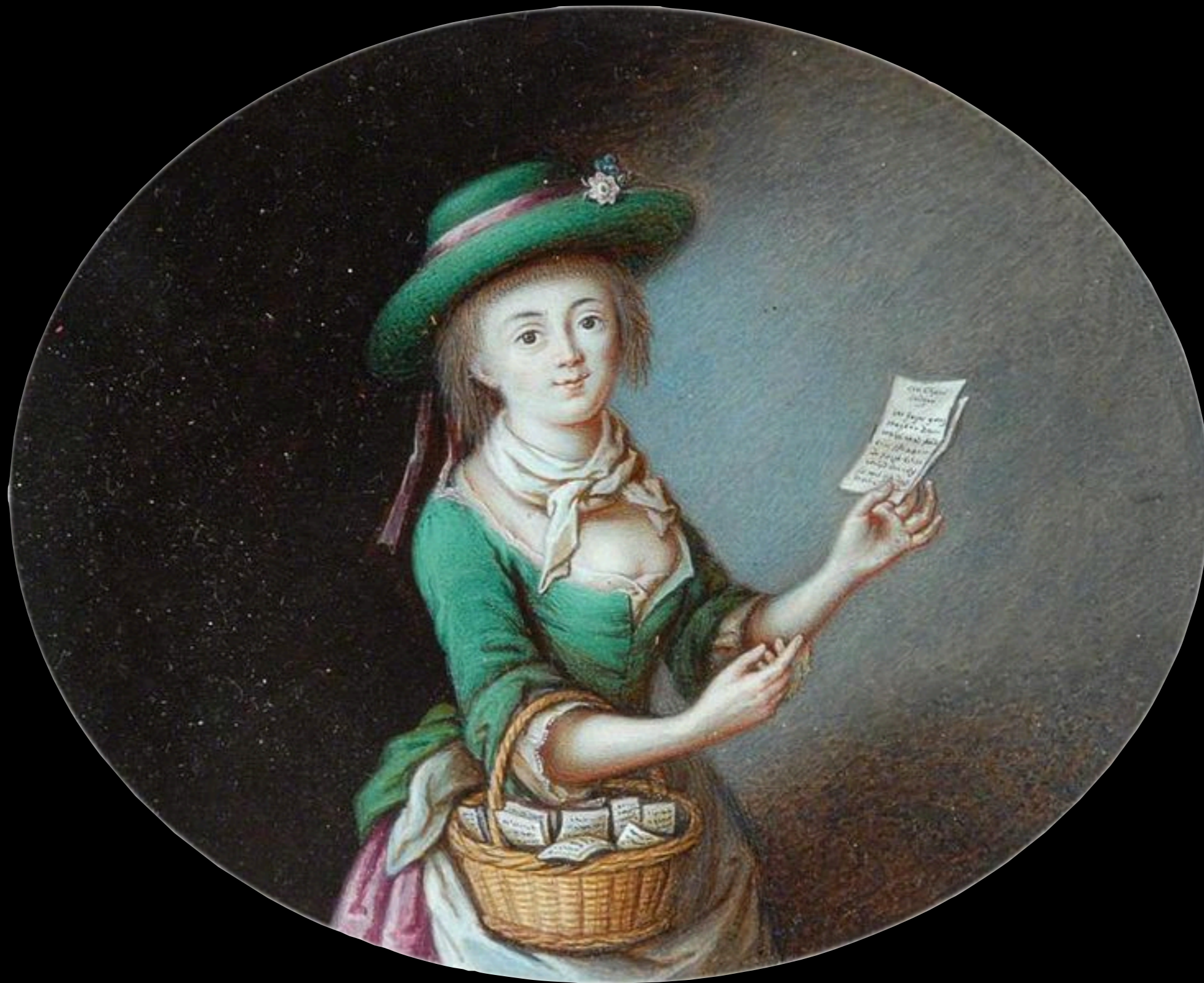
French Girl with a Basket of Pamphlets by French School 18th Century (The Bowes Museum)