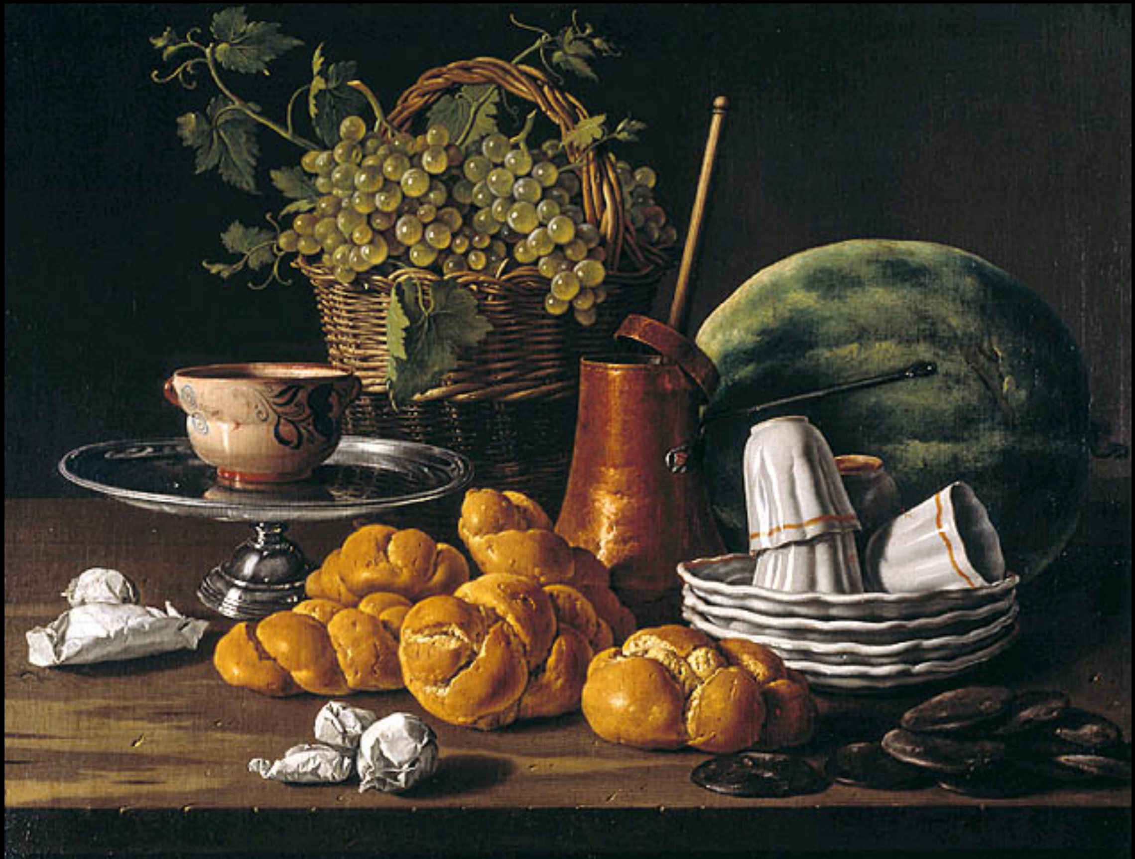
Spanish Still Life Showing a Wicker Basket by Luis Mendez Late 18th Century (Private Collection)