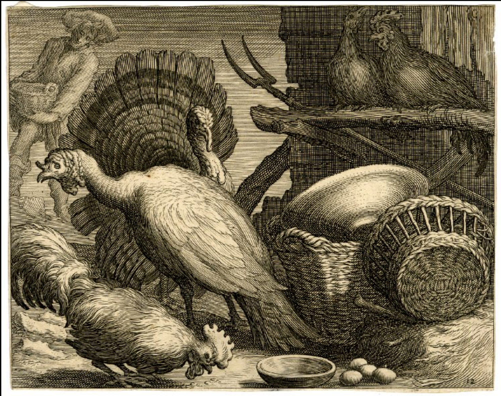
Bird Study by ABoeitiuz Adamsz after braham Bloemaert 1611 (Private Collection)