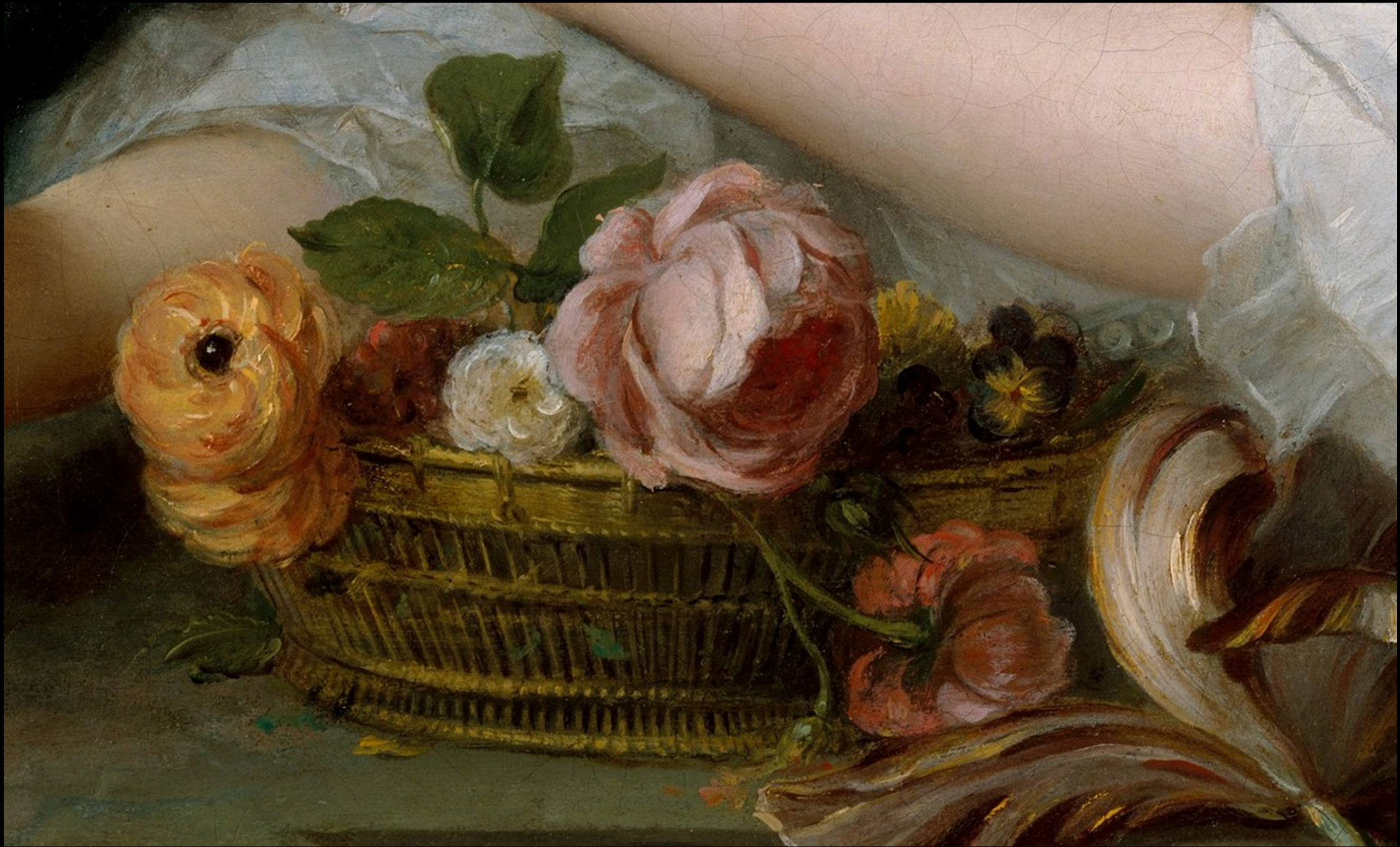
Portrait of a Woman, Called the Marquise Perrin de Cypierre with a Wicker Basket by Jean Marc Nattier 1753 (Metropolitan Museum of Art)