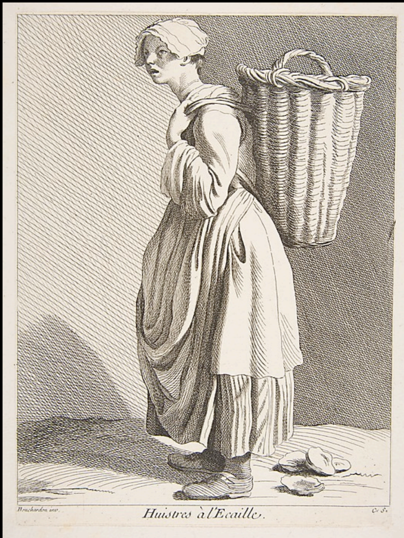
Oyster Seller with a Wicker Basket by Anne Claude Philippe de Tubières, Comte de Caylus after Edme Bouchardon 1738 (Metropolitan Museum of Art)