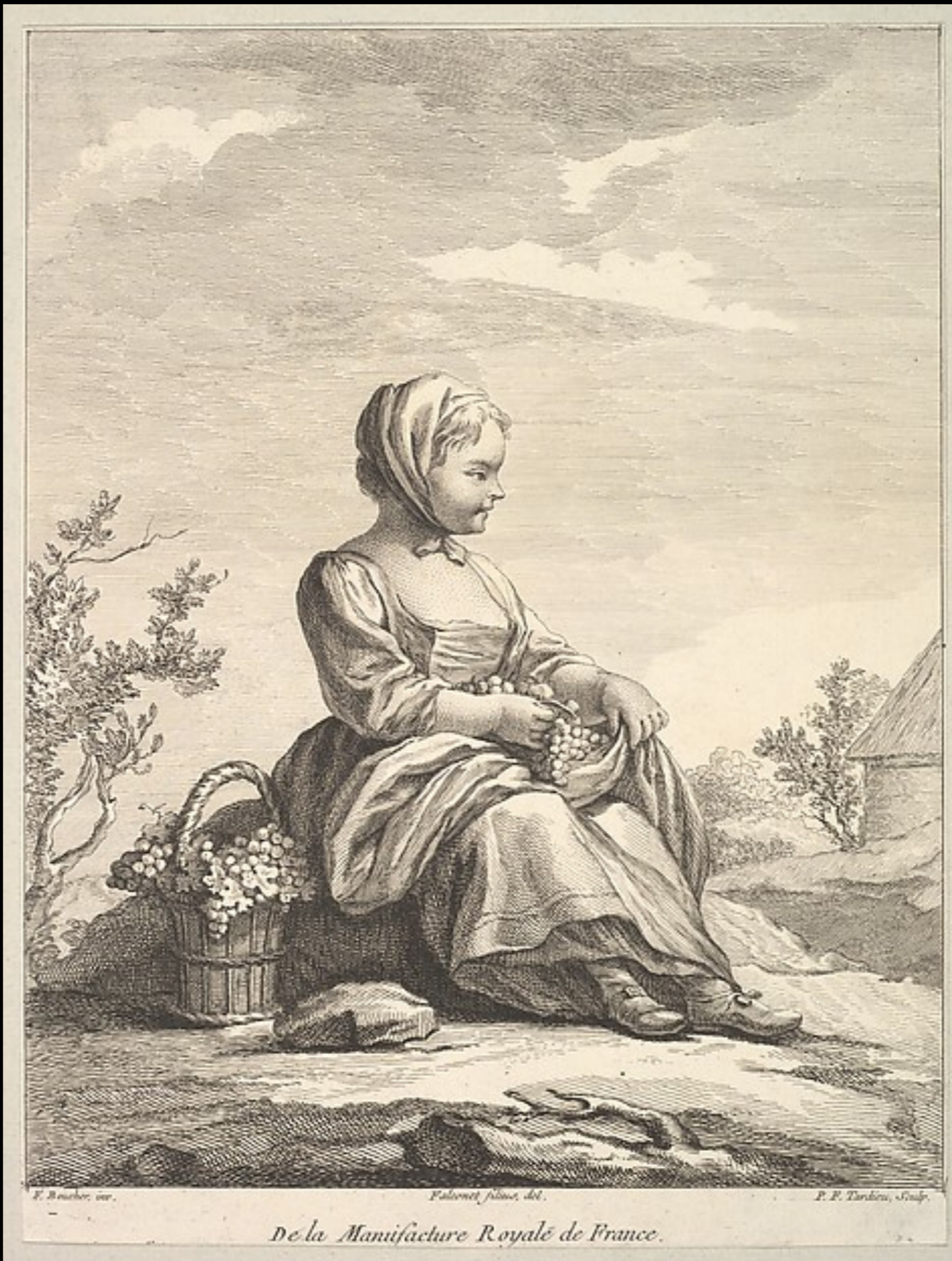
De La Manufacture Royale de France by Pierre François Tardieu c. 1758+ (Metropolitan Museum of Art)