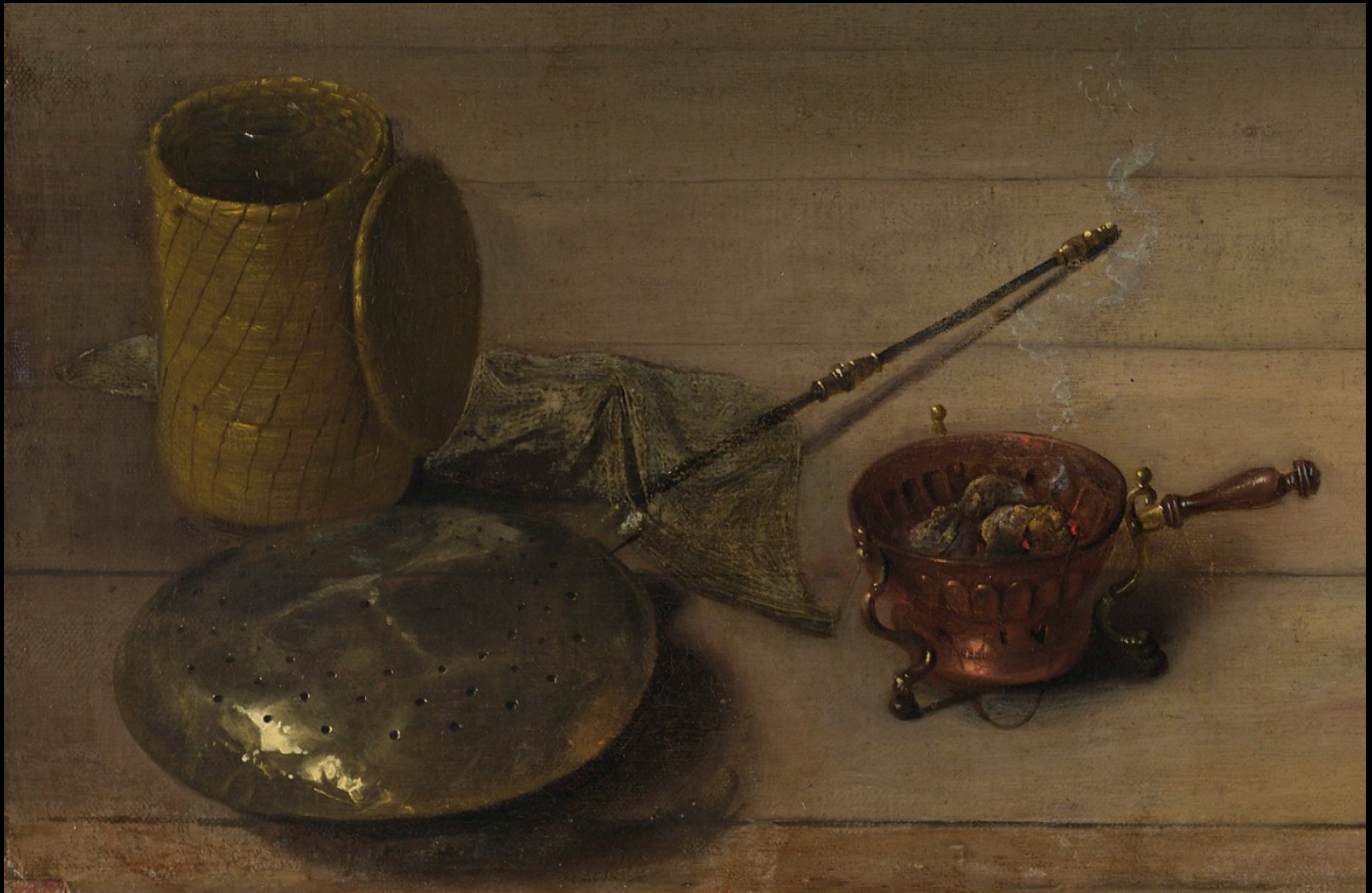
The Lovesick Maiden (Dutch) by Jan Steen c. 1660 (Metropolitan Museum of Art)