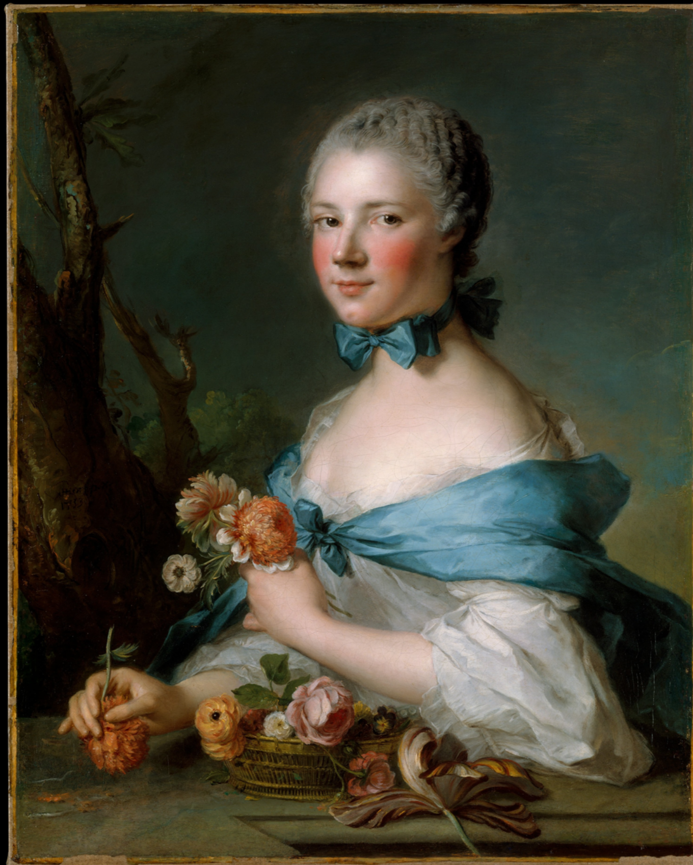
Portrait of a Woman, Called the Marquise Perrin de Cypierre with a Wicker Basket by Jean Marc Nattier 1753 (Metropolitan Museum of Art)