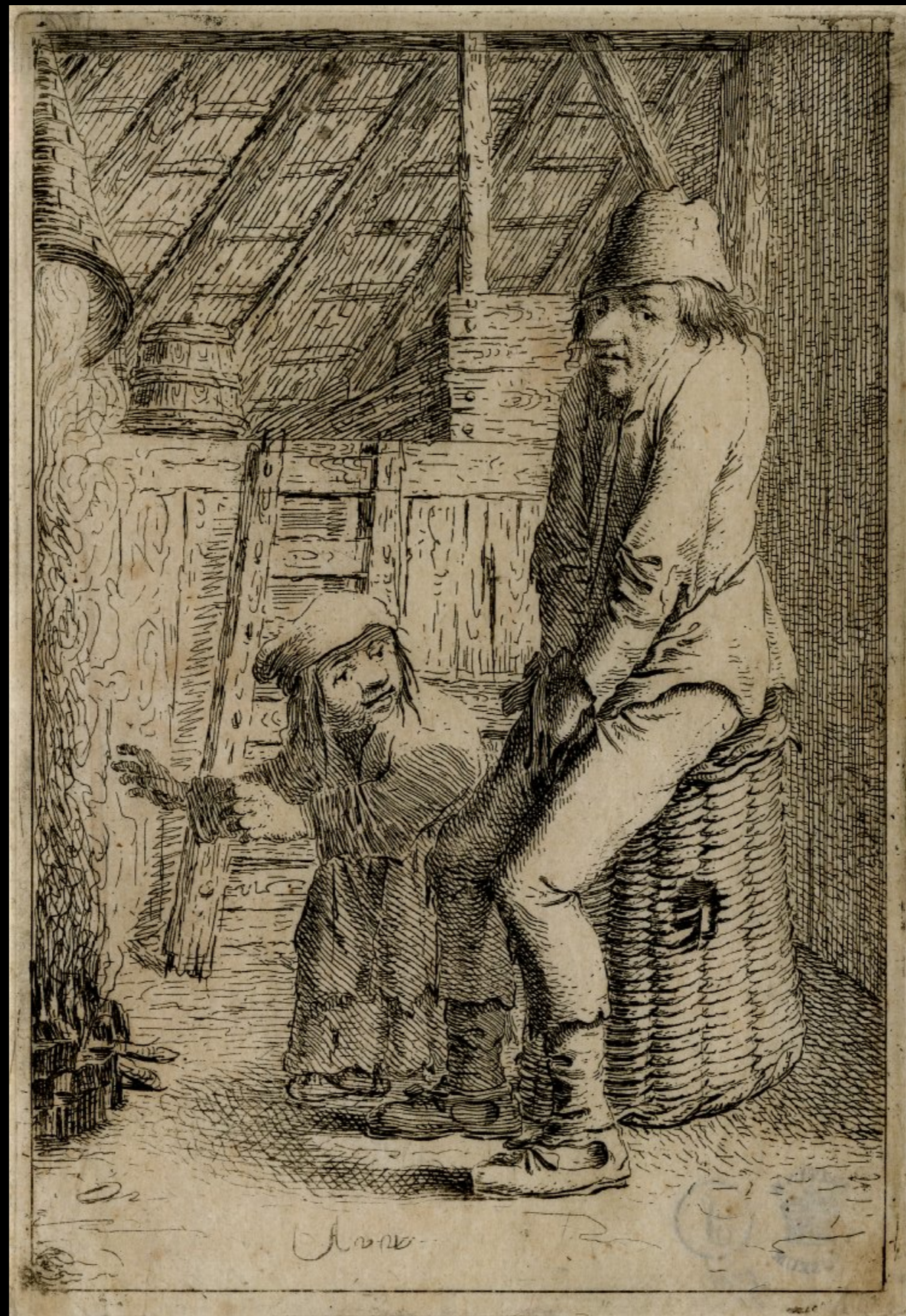
A Dutch Peasant with a Wicker Basket by Aert van Waes c. 1640 - 1650 (The British Museum)