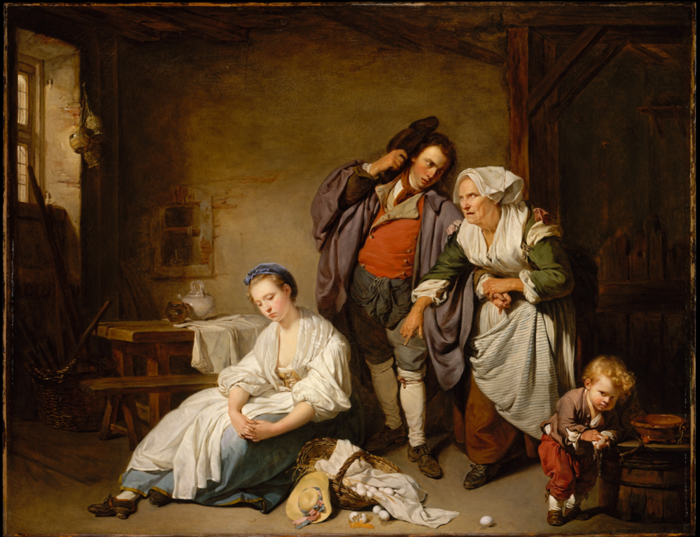
Broken Eggs by Jean-Baptiste Greuze 1756 (Metropolitan Museum of Art)