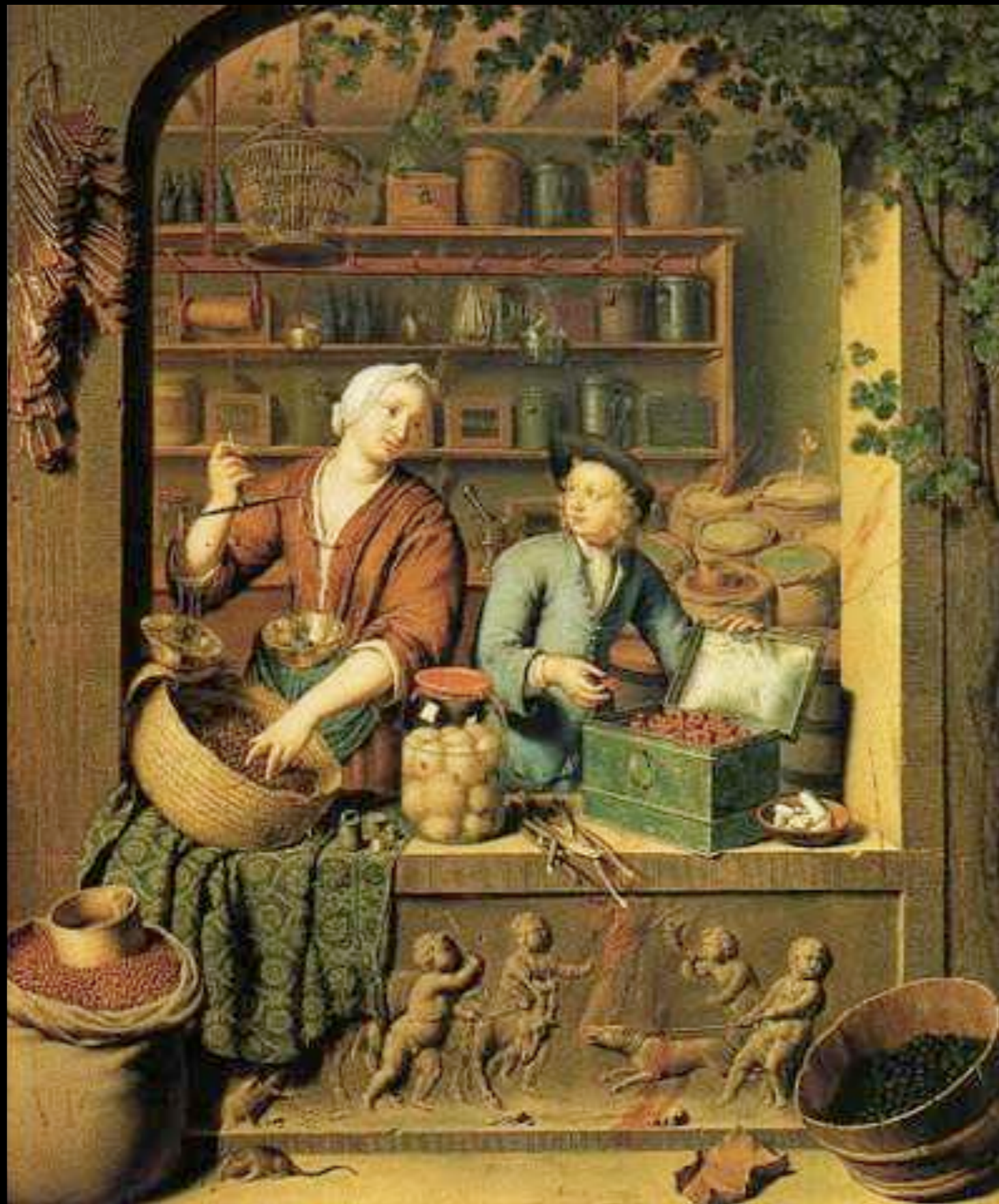
Grocer's Shop in an Alcove by Willem van Mieris c. 1732 (Private Collection)