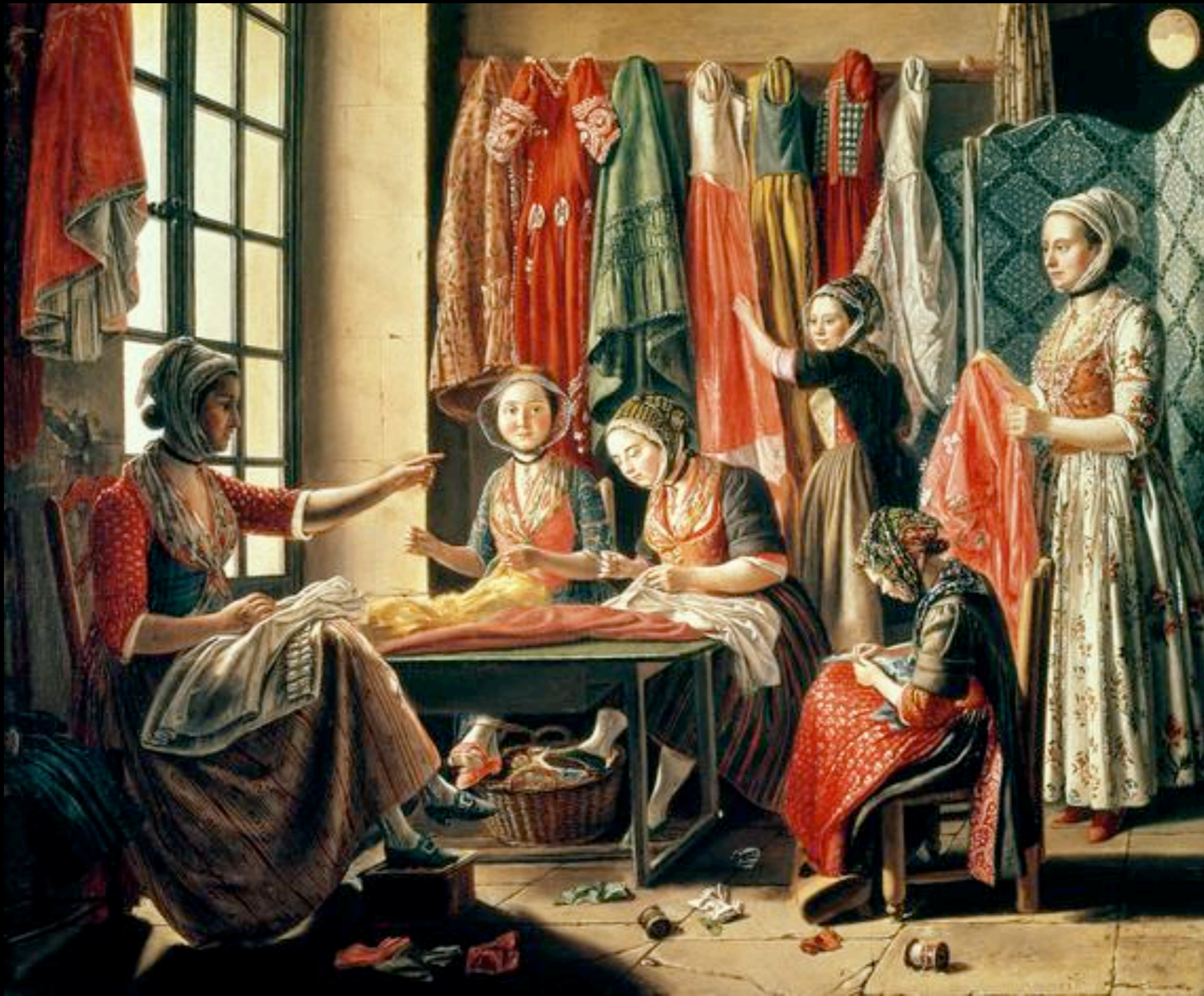
The Couturier's Workshop, Arles Revealing a Wicker Basket by Antoine Raspal c. 1760