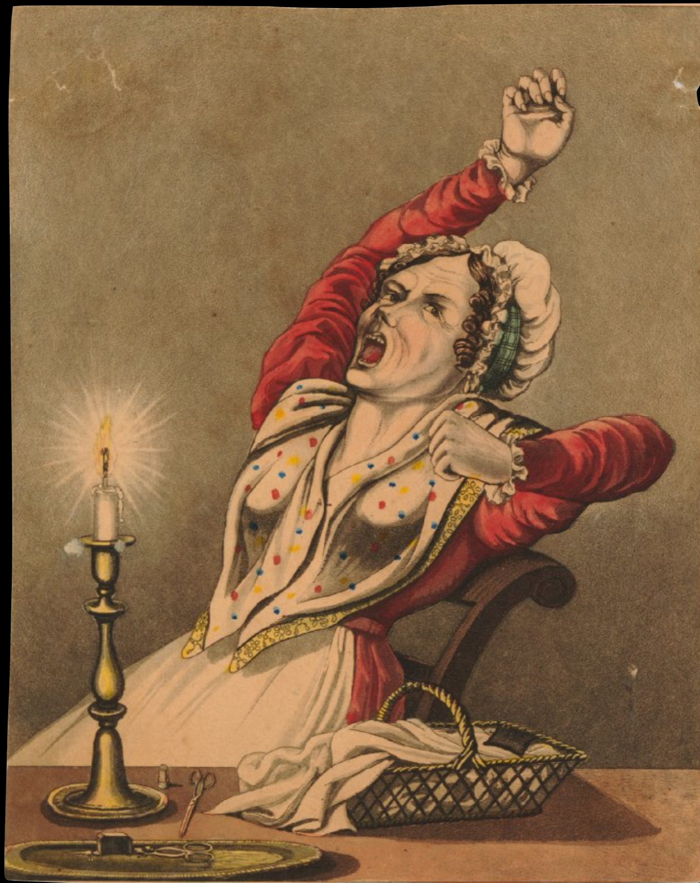
A Dutch Woman Yawning with a Wicker Basket by Conelis van Noorde c. 1785 (The British Museum)