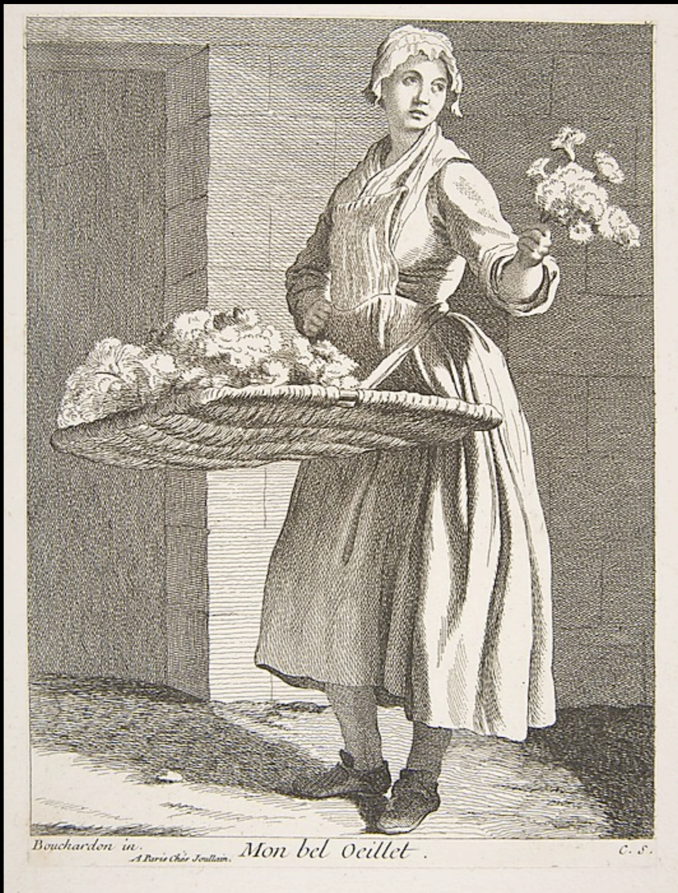
Flower Vendor by Anne Claude Philippe de Tubières, Comte de Caylus after Edme Bouchardon 1738 (Metropolitan Museum of Art)