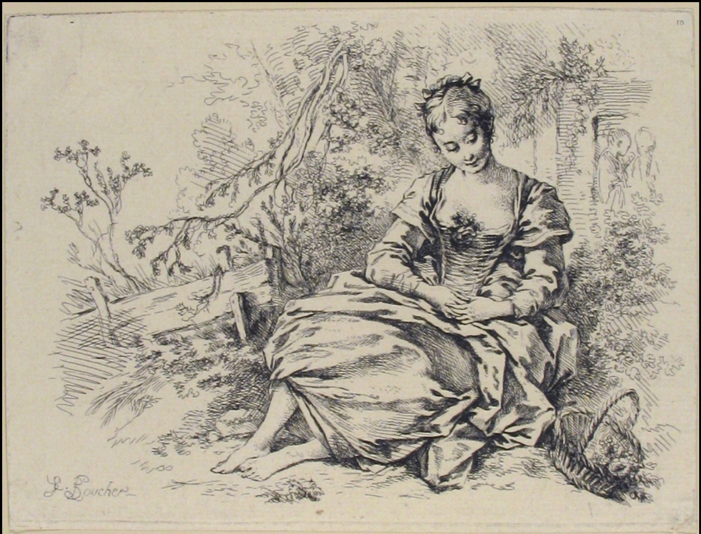
Girl in a Landscape with a Basket of Flowers by François Boucher c. Mid 18th Century (Metropolitan Museum of Art)