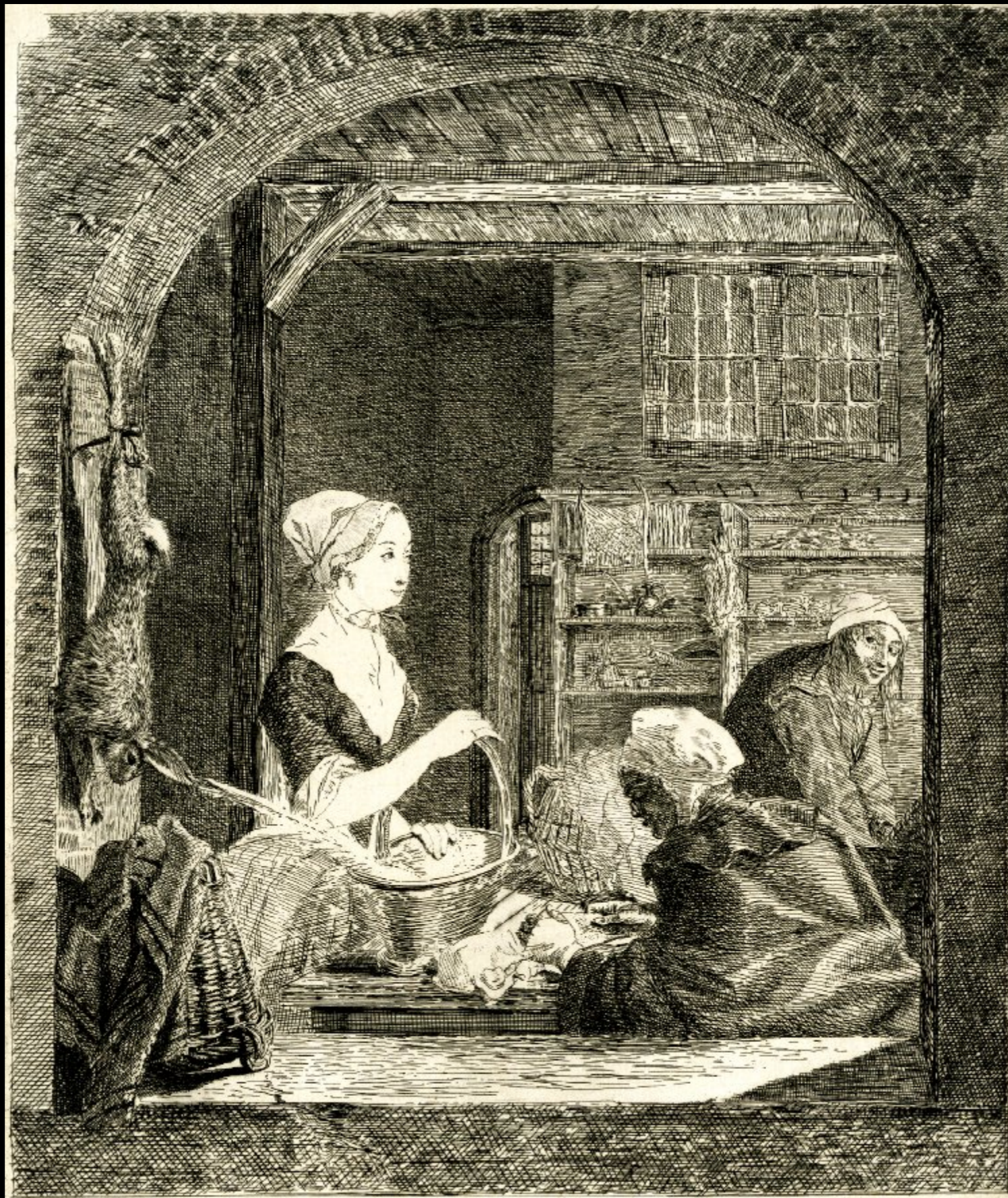
The Poultry Girl Showing a Wicker Basket by Jean Baptiste Bernard Coclers c. 1780 (The British Museum)