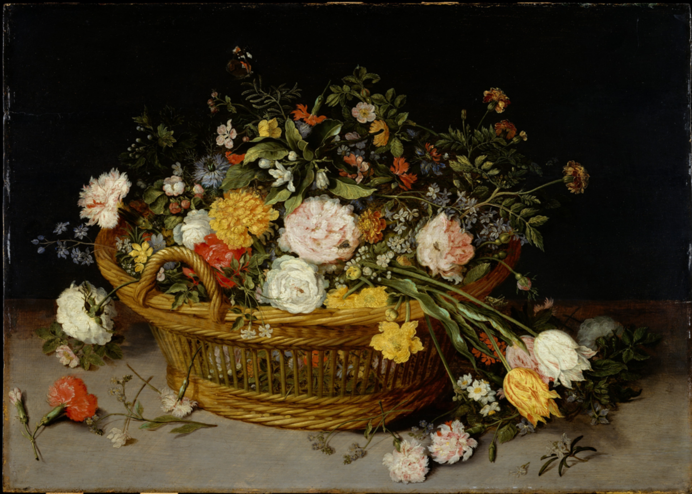
A Basket of Flowers (Flemish) by Jan Brueghel the Younger c. 1620 (Metropolitan Museum of Art)