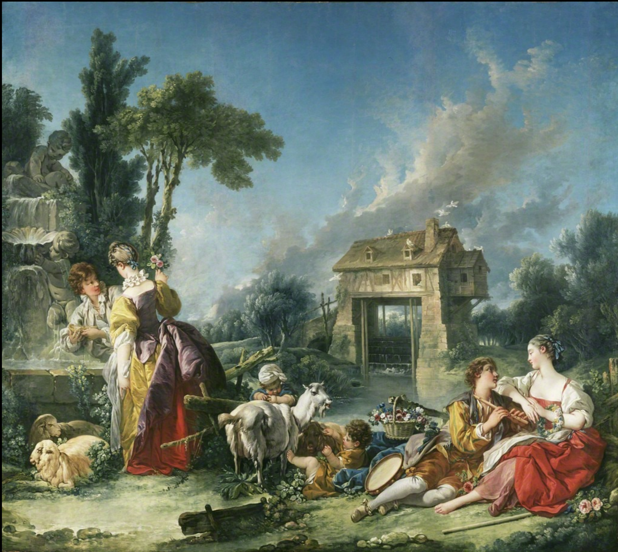
“The Fountain of Love” by Francois Boucher 1748 (National Gallery of Art, Washington, D.C.)