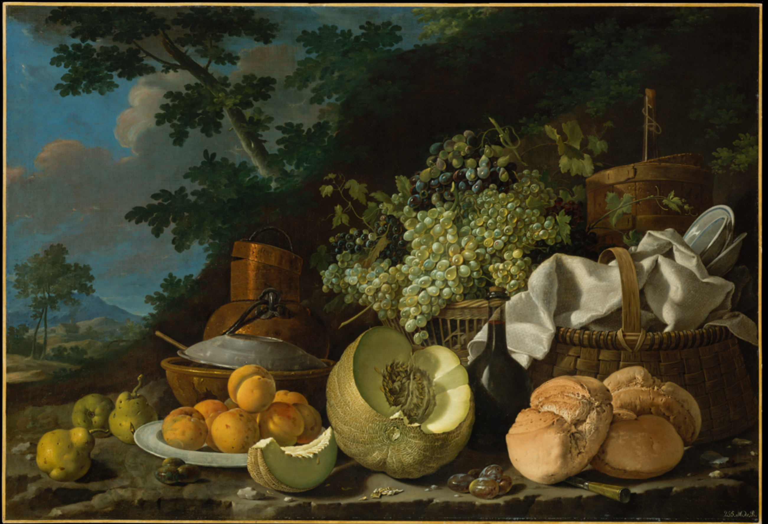
The Afternoon Meal (Spanish) by Luis Meléndez 1772 (Metropolitan Museum of Art)