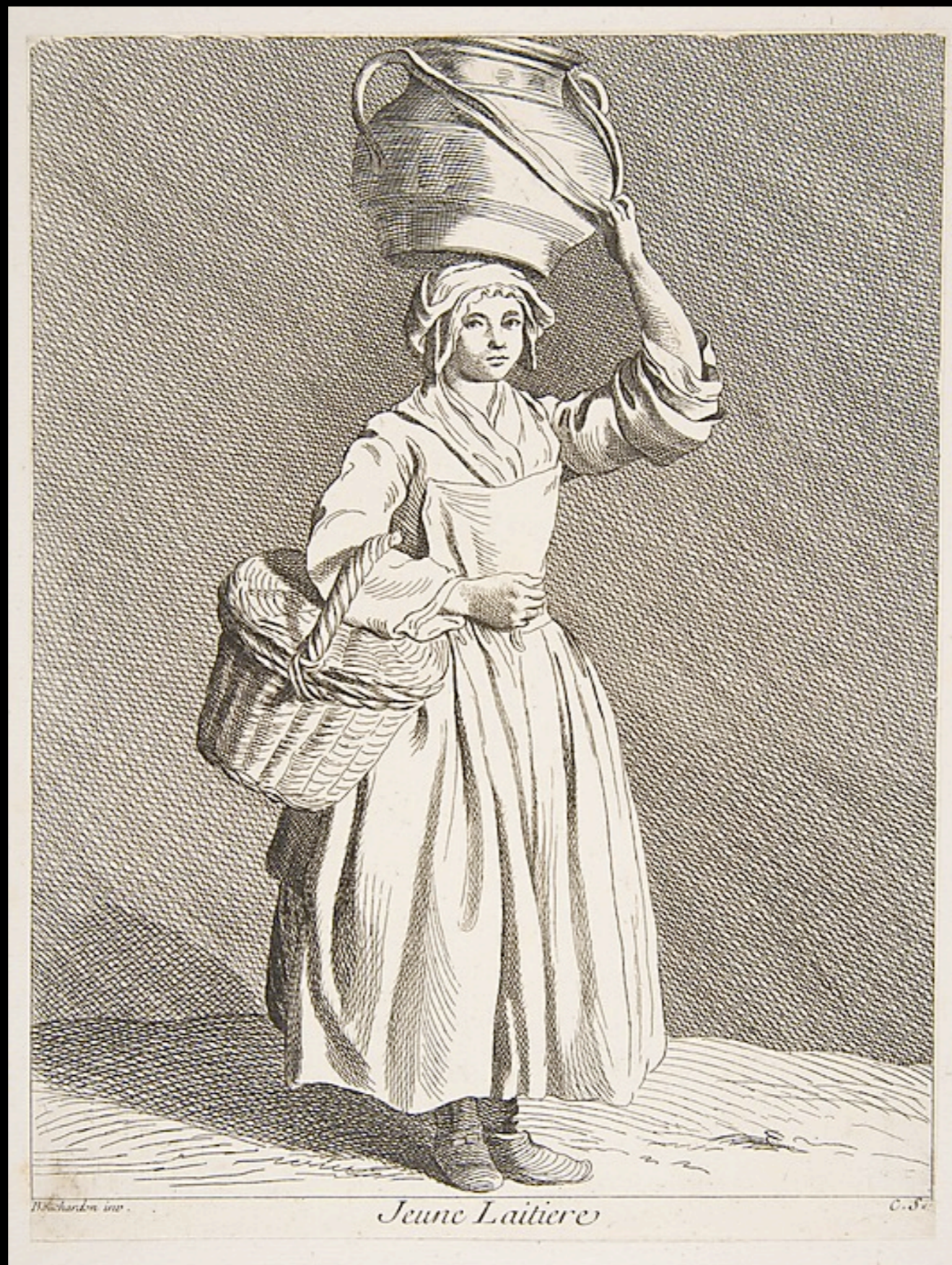
Young Milkmaid by Anne Claude Philippe de Tubières, Comte de Caylus after Edme Bouchardon 1738