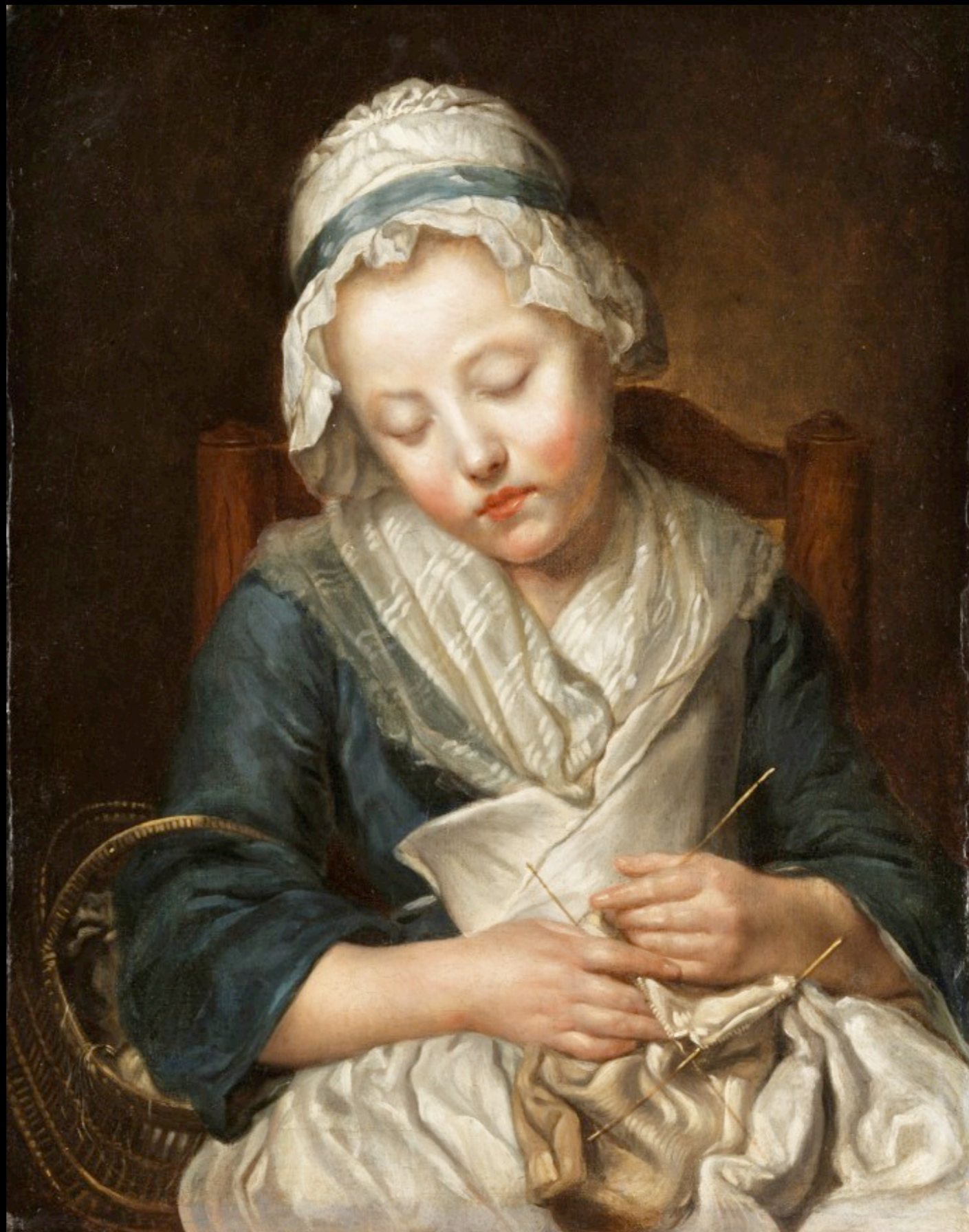
“Knitter Asleep” with Her Wicker Knitting Basket by Jean-Baptiste Greuze (1724-1805)