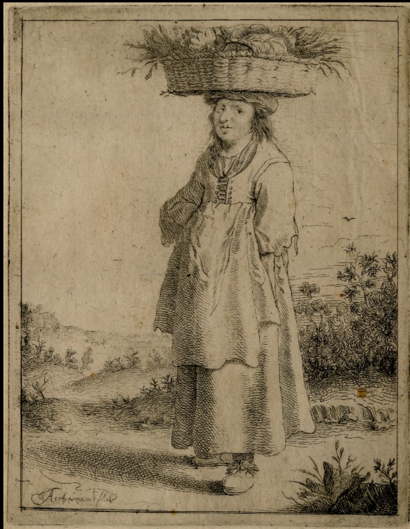
A Dutch Peasant Woman with a Wicker Basket by Aert van Waes c. 1640 - 1650 (The British Museum)