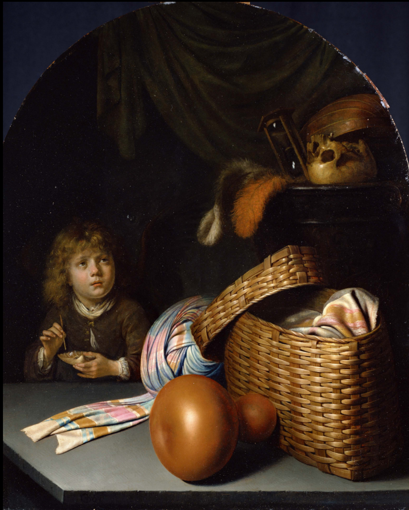
Dutch Boy Blowing Bubbles by Gerrit Dou c. 1635 - 1636 (National Museum of Western Art)