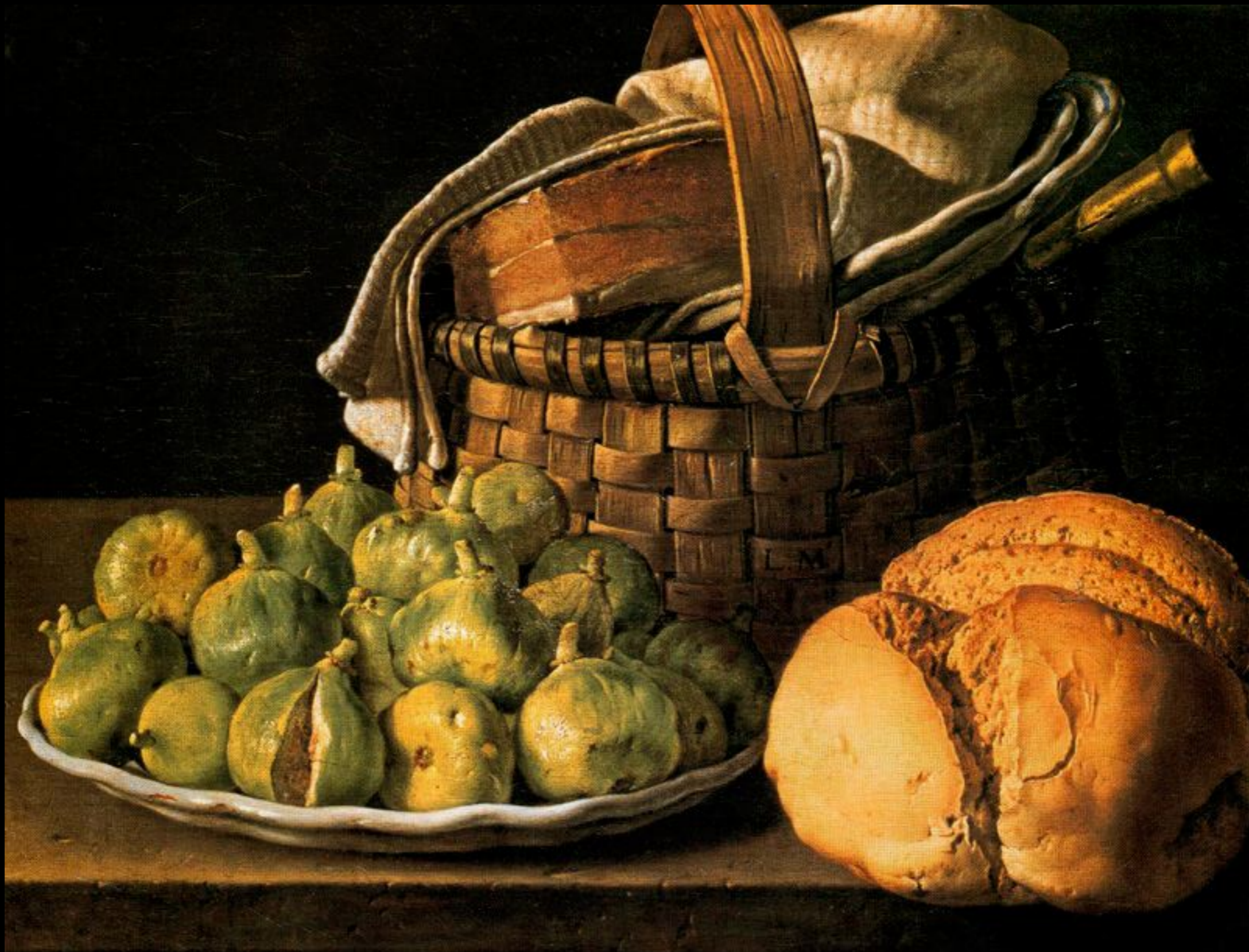
Spanish Still Life Showing a Split Wood Basket by Luis Mendez Late 18th Century (Private Collection)