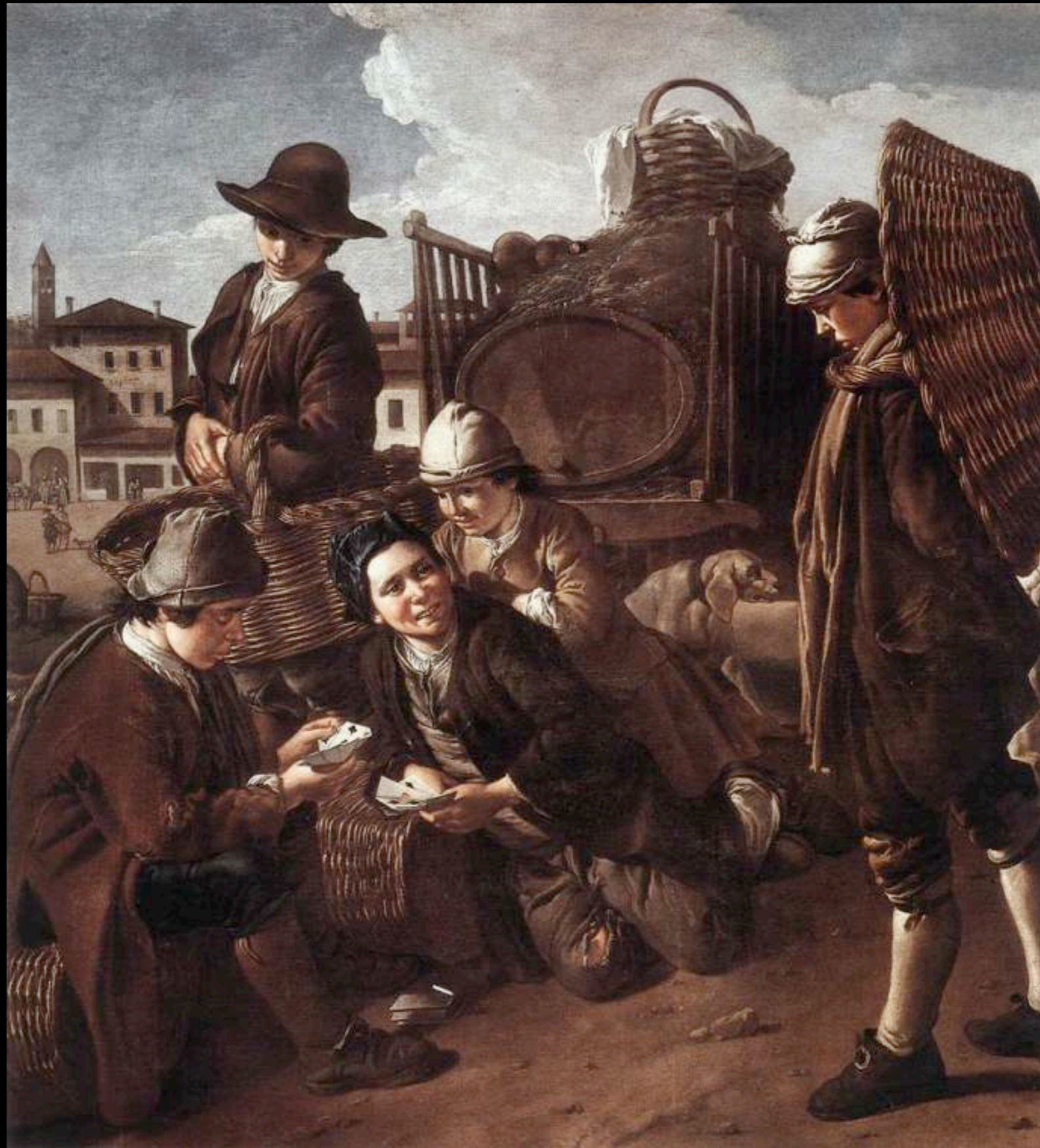
Italian Boys Playing Cards by Giacomo Ceruti of Italy (1698 - 1757)