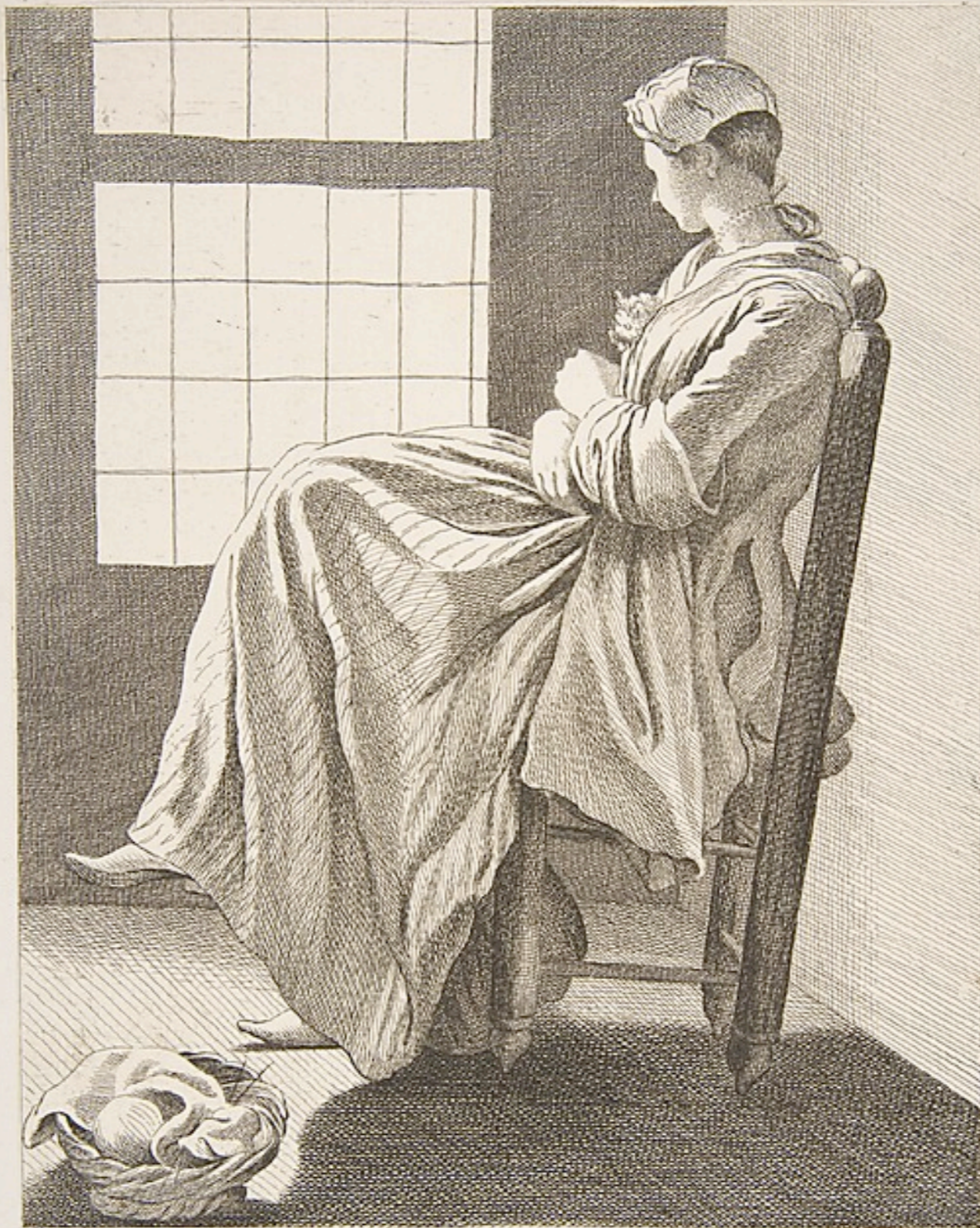
Bouchardon in A Paris Chez Joullain. Apprentisse Couturiere