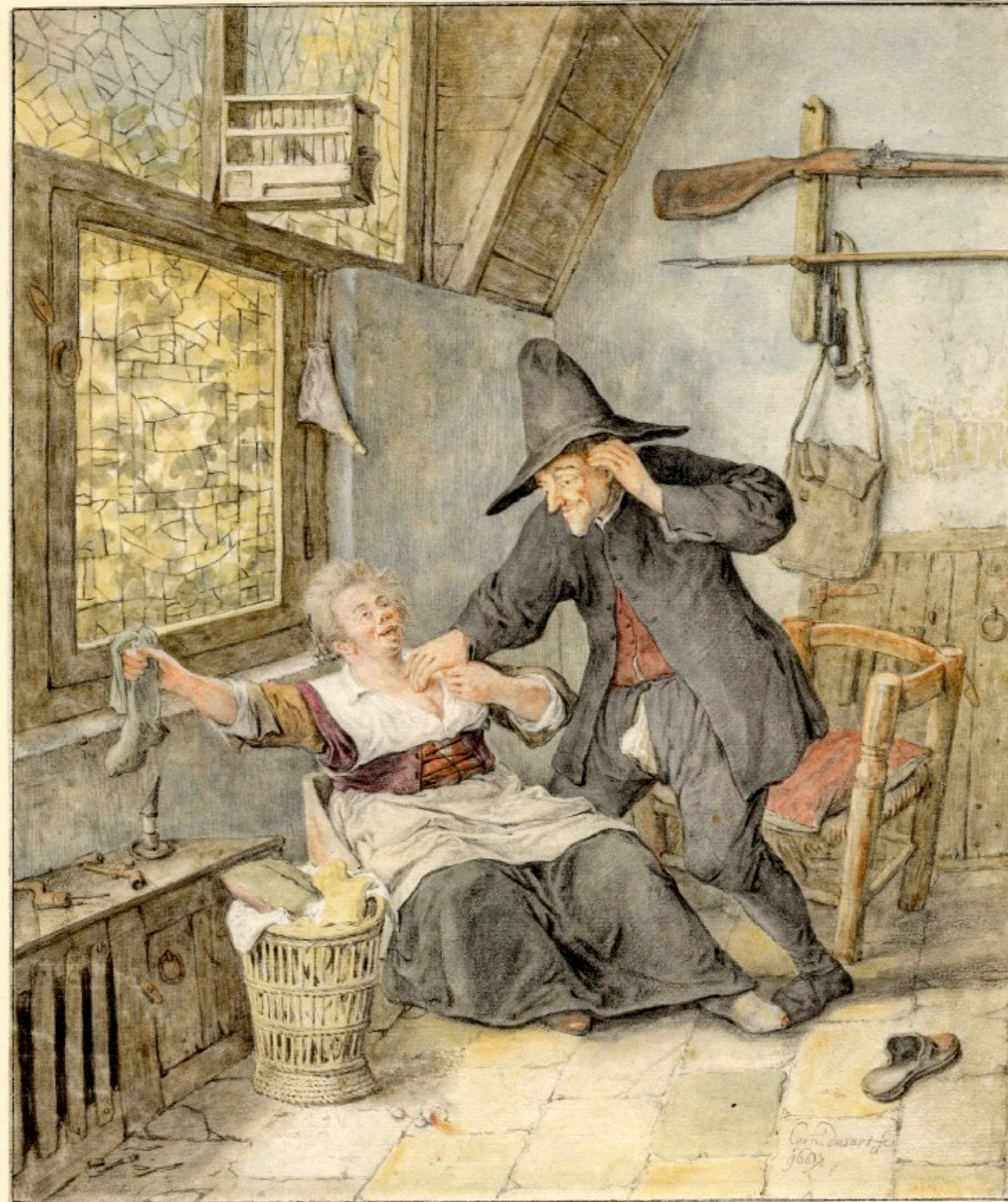
by Cornelis Dusart c. 1675 (The British Museum)