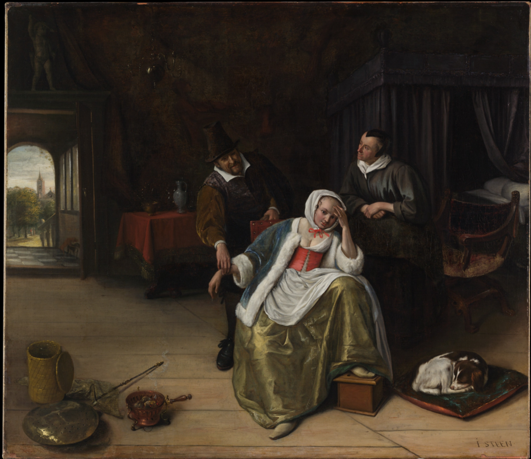
The Lovesick Maiden (Dutch) by Jan Steen c. 1660 (Metropolitan Museum of Art)