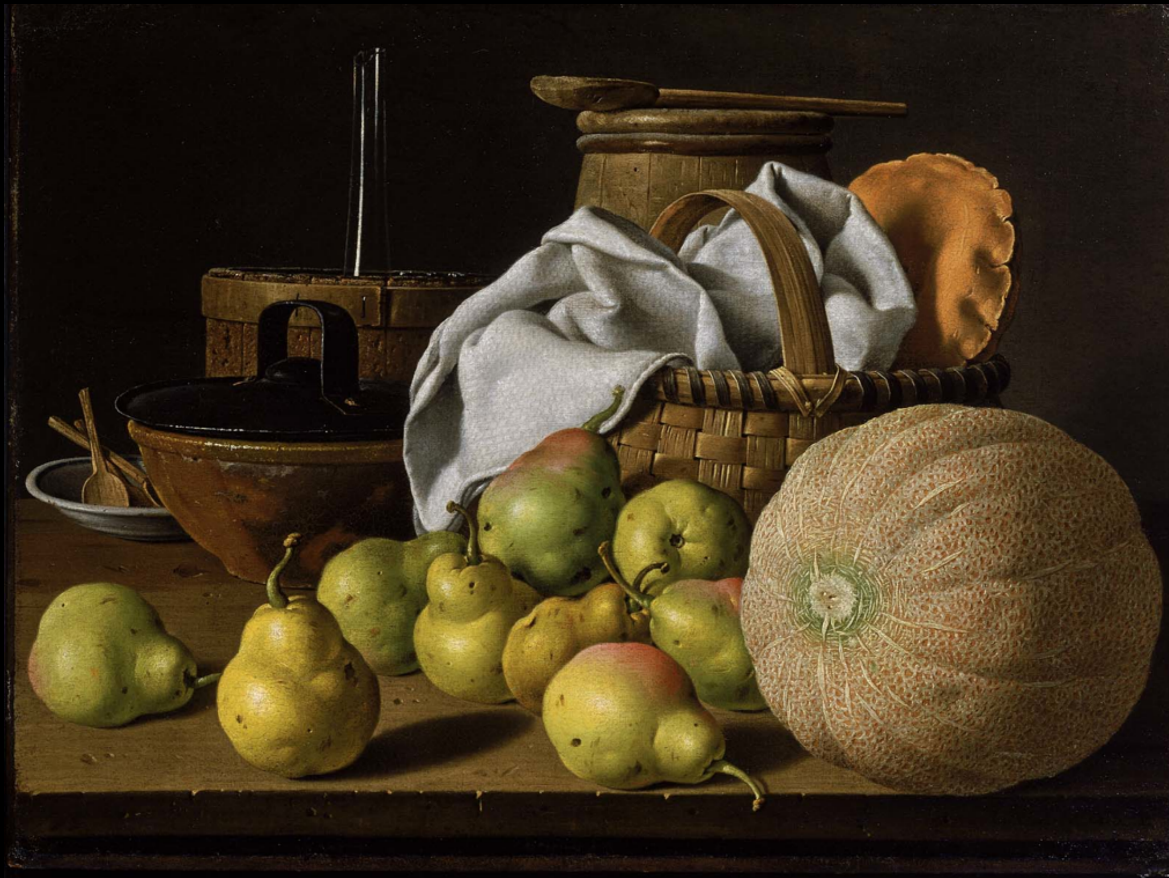
Spanish Still Life Showing a Split Wood Basket by Luis Mendez Late 18th Century (Private Collection)