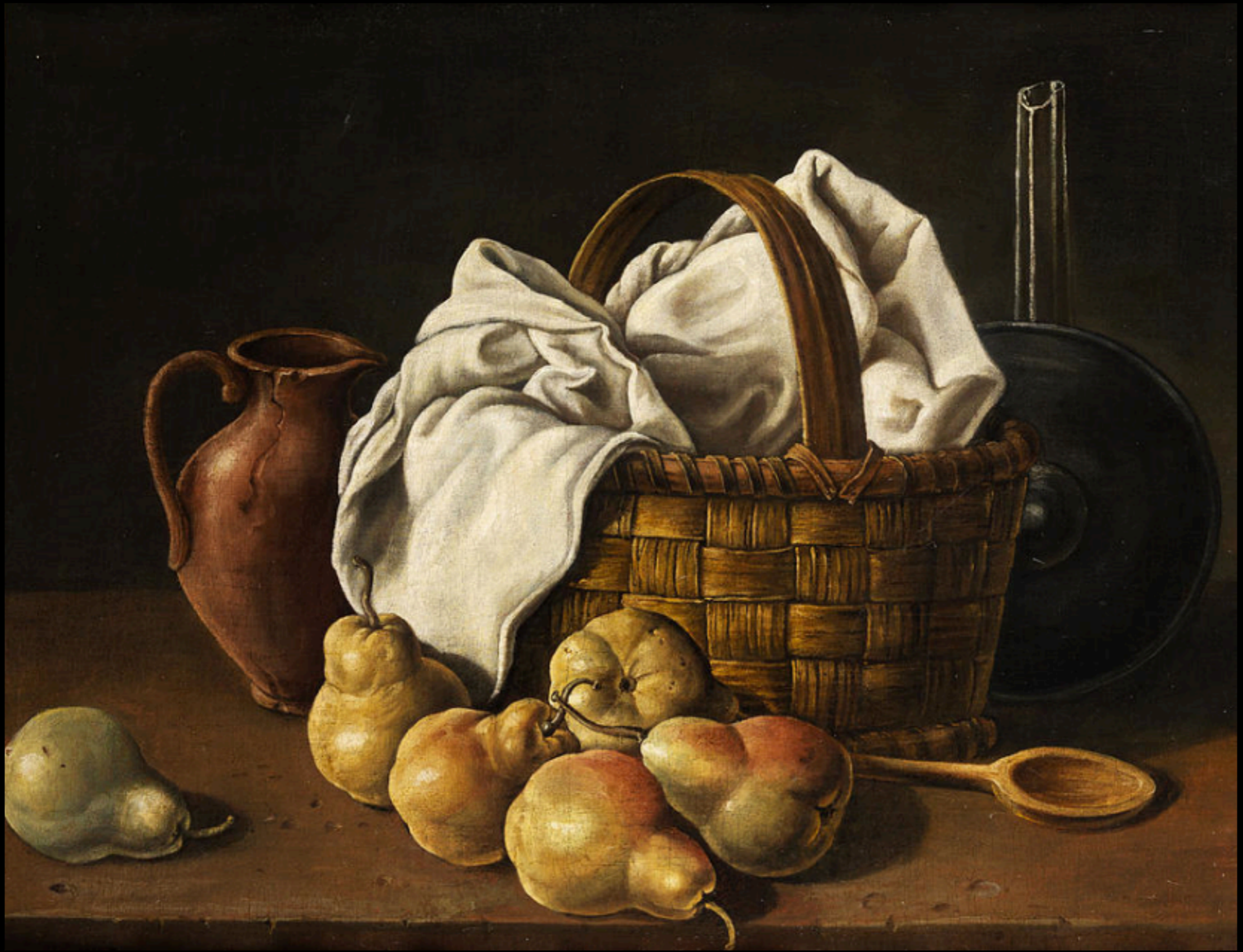
Spanish Still Life Showing a Split Wood Basket by Luis Mendez Late 18th Century (Private Collection)