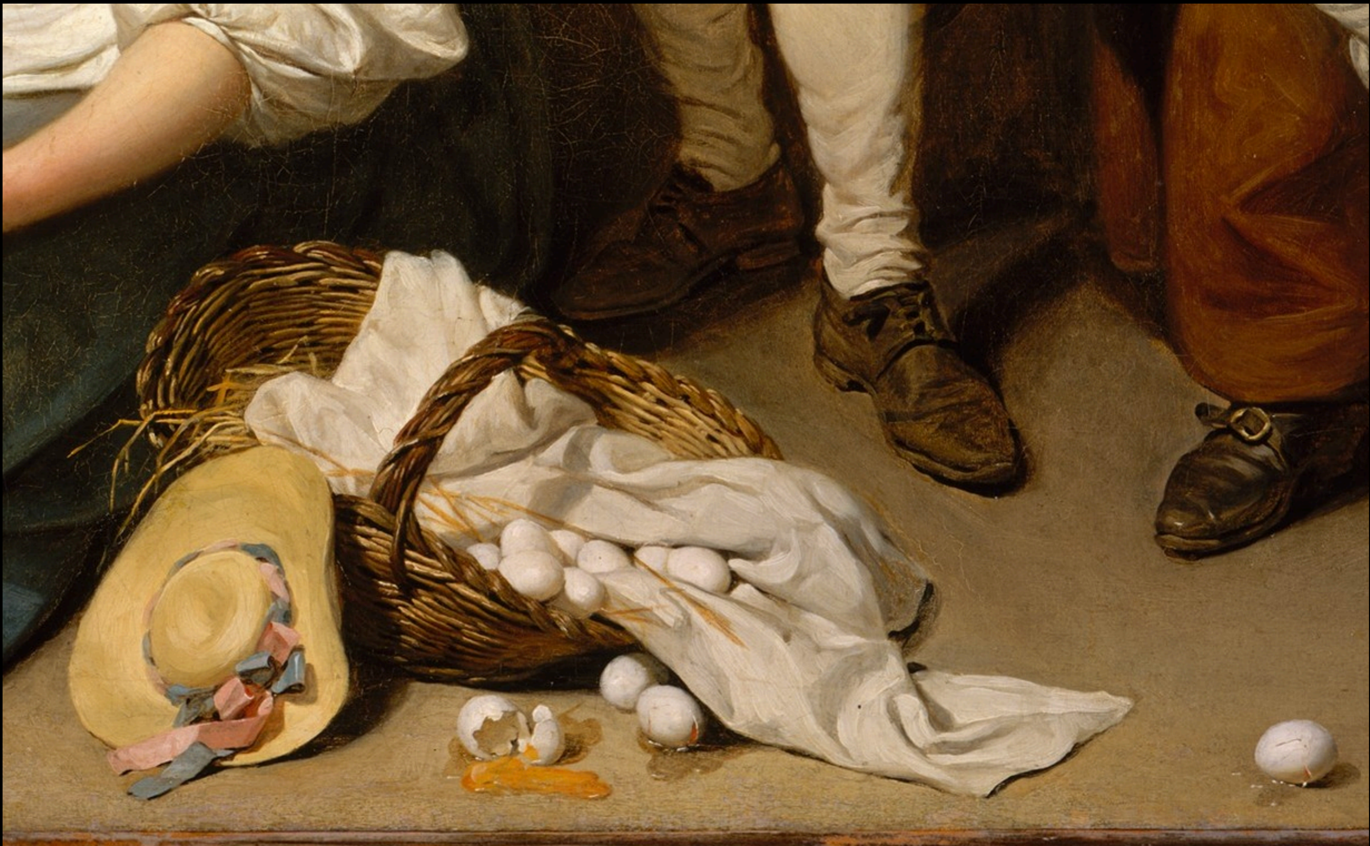
Broken Eggs by Jean-Baptiste Greuze 1756 (Metropolitan Museum of Art)