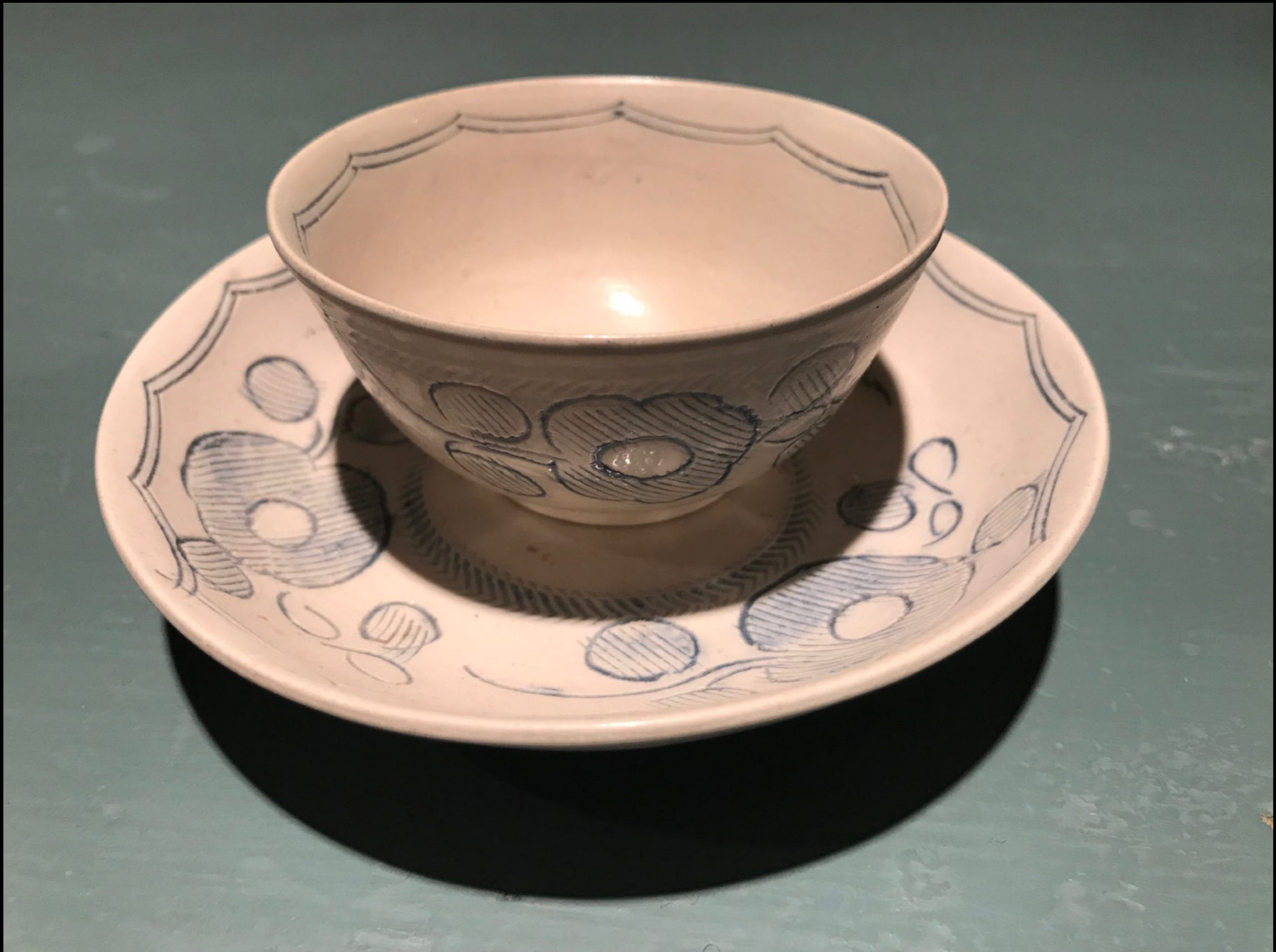
English Staffordshire Scratch Blue Cup & Saucer