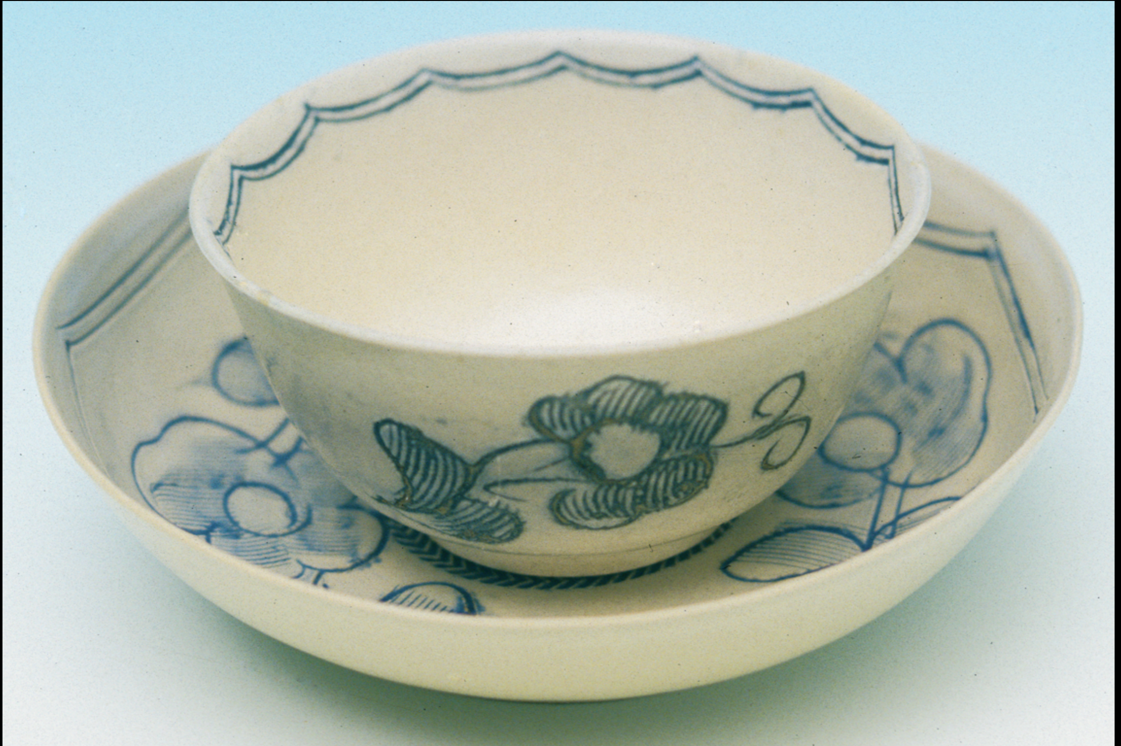
English Staffordshire Scratch Blue Cup & Saucer