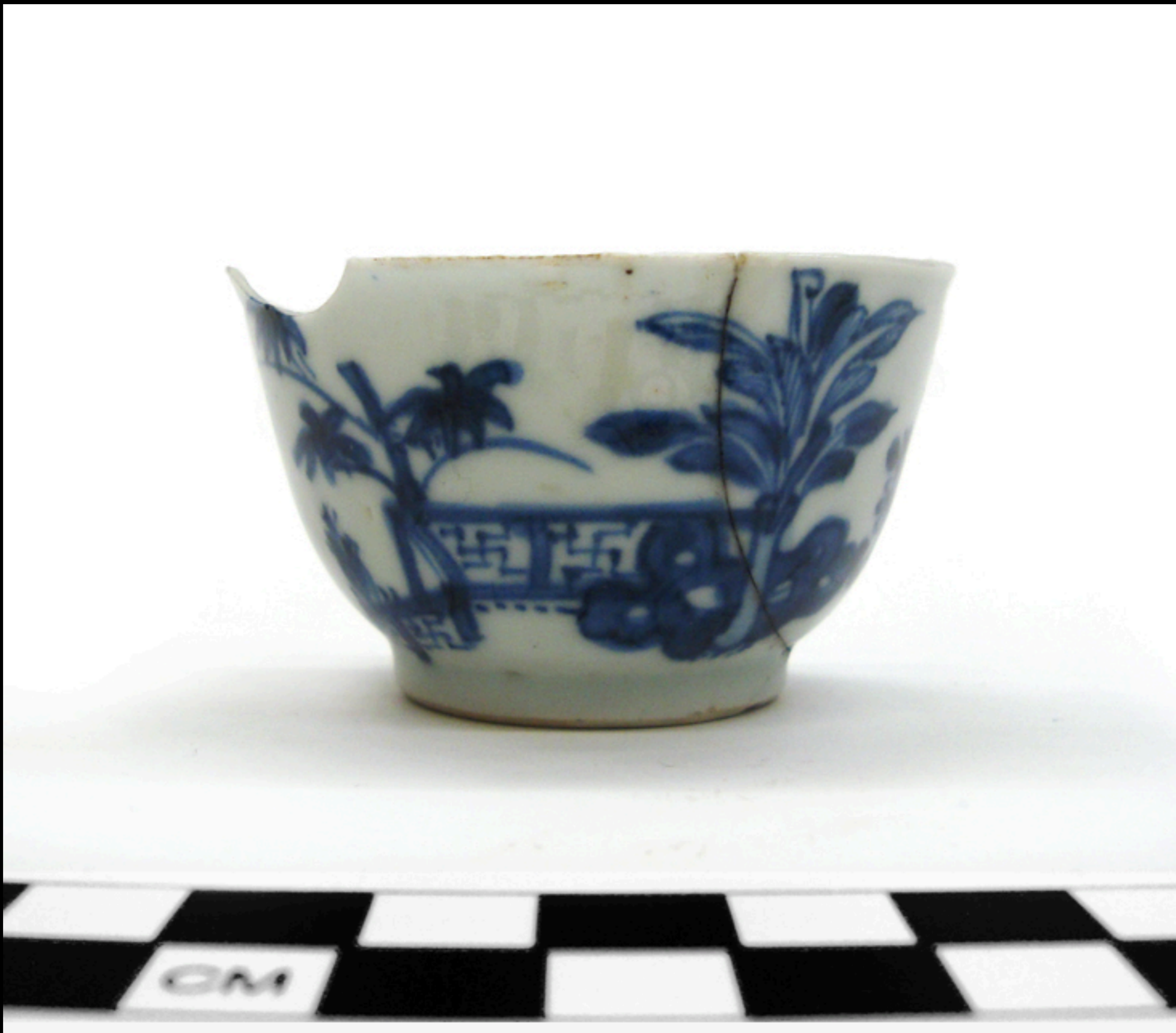
Chinese Porcelain Tea Cup Excavated from a Privy at the Three Cranes Tavern, Charlestown, Massachusetts Burned by the British on June 17, 1775 c. 1770 (City of Boston Archeology Program)