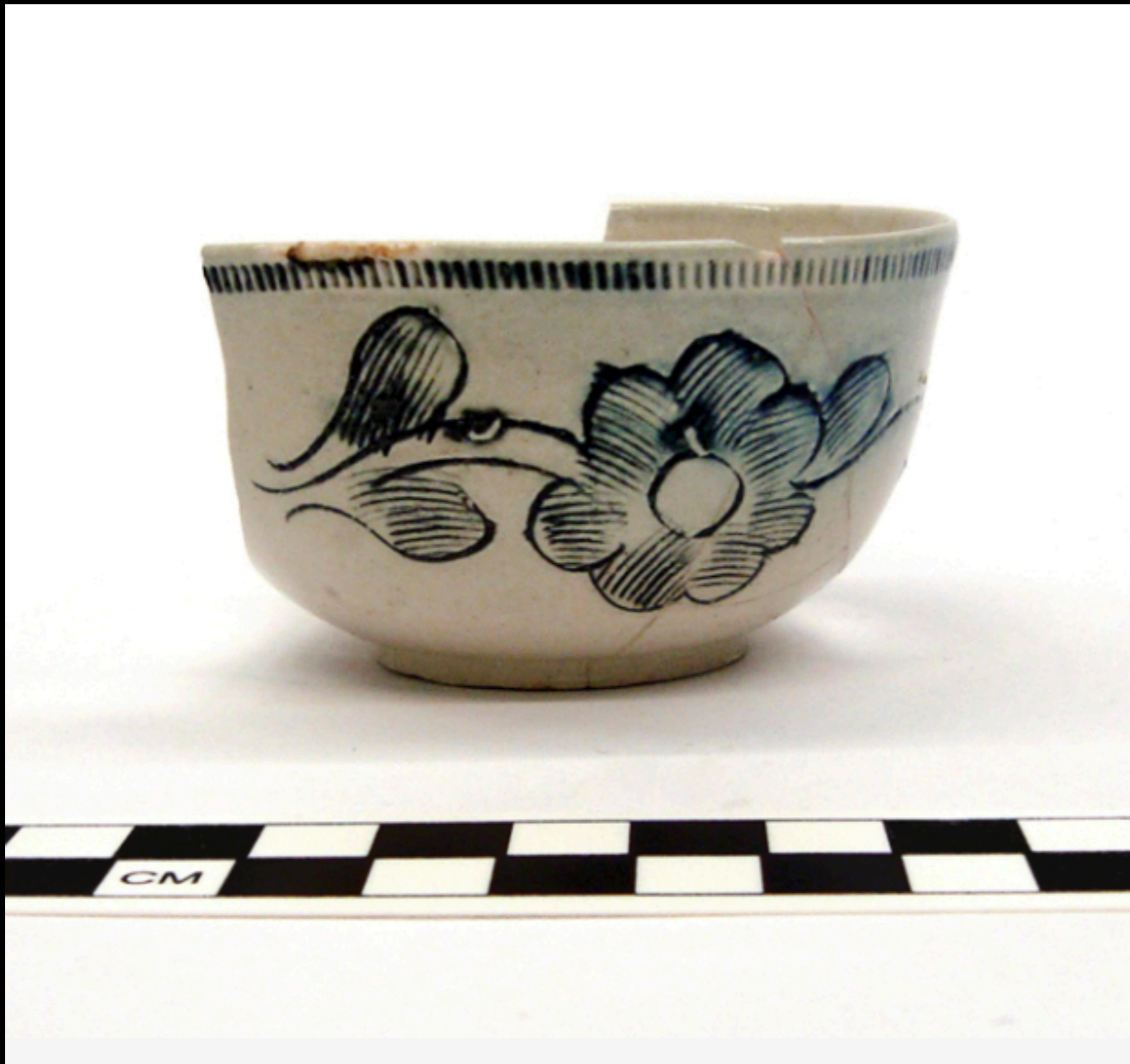
English Scratch Blue Stoneware Tea Cup Excavated from a Privy at the Three Cranes Tavern, Charlestown, Massachusetts Burned by the British on June 17, 1775 c. 1770