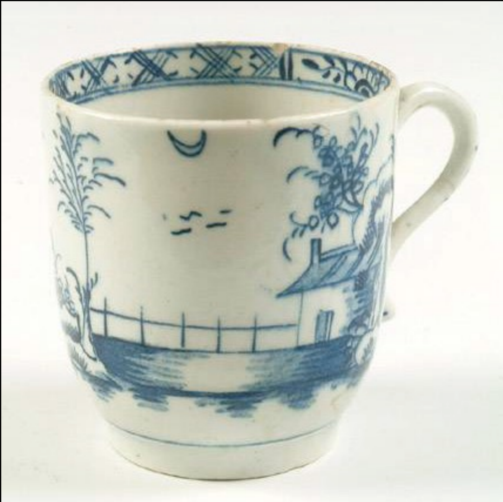
English Soft Paste Porcelain Tea Cup from Suffolk Lowestoft c. 1770 - 1780 (Museum of London)