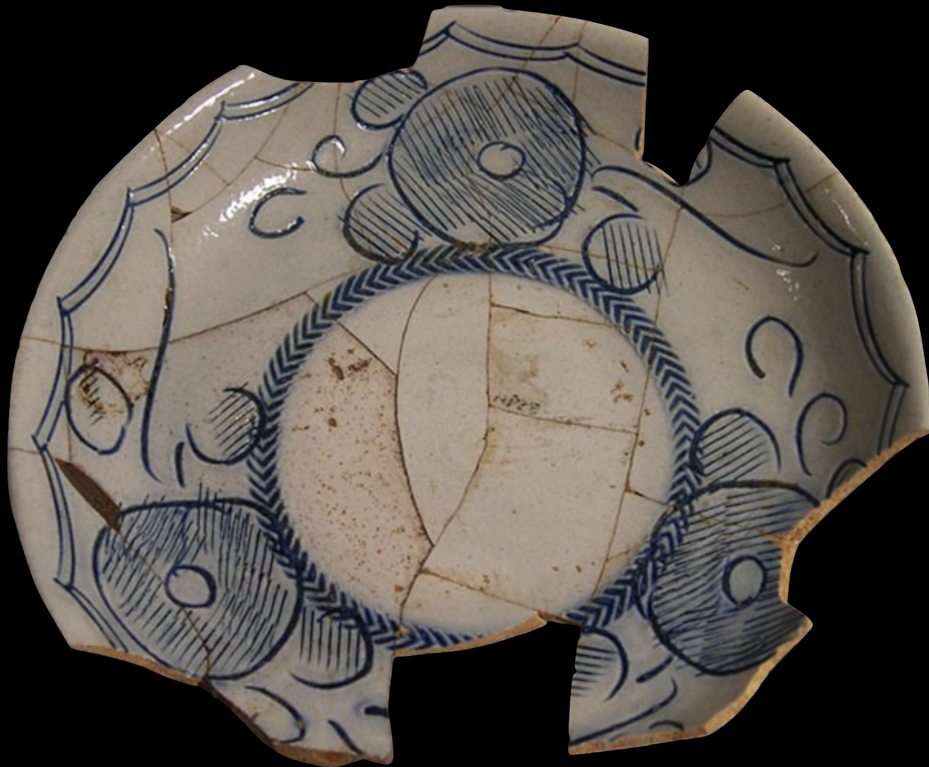
English Staffordshire Scratch Blue Cup & Saucer