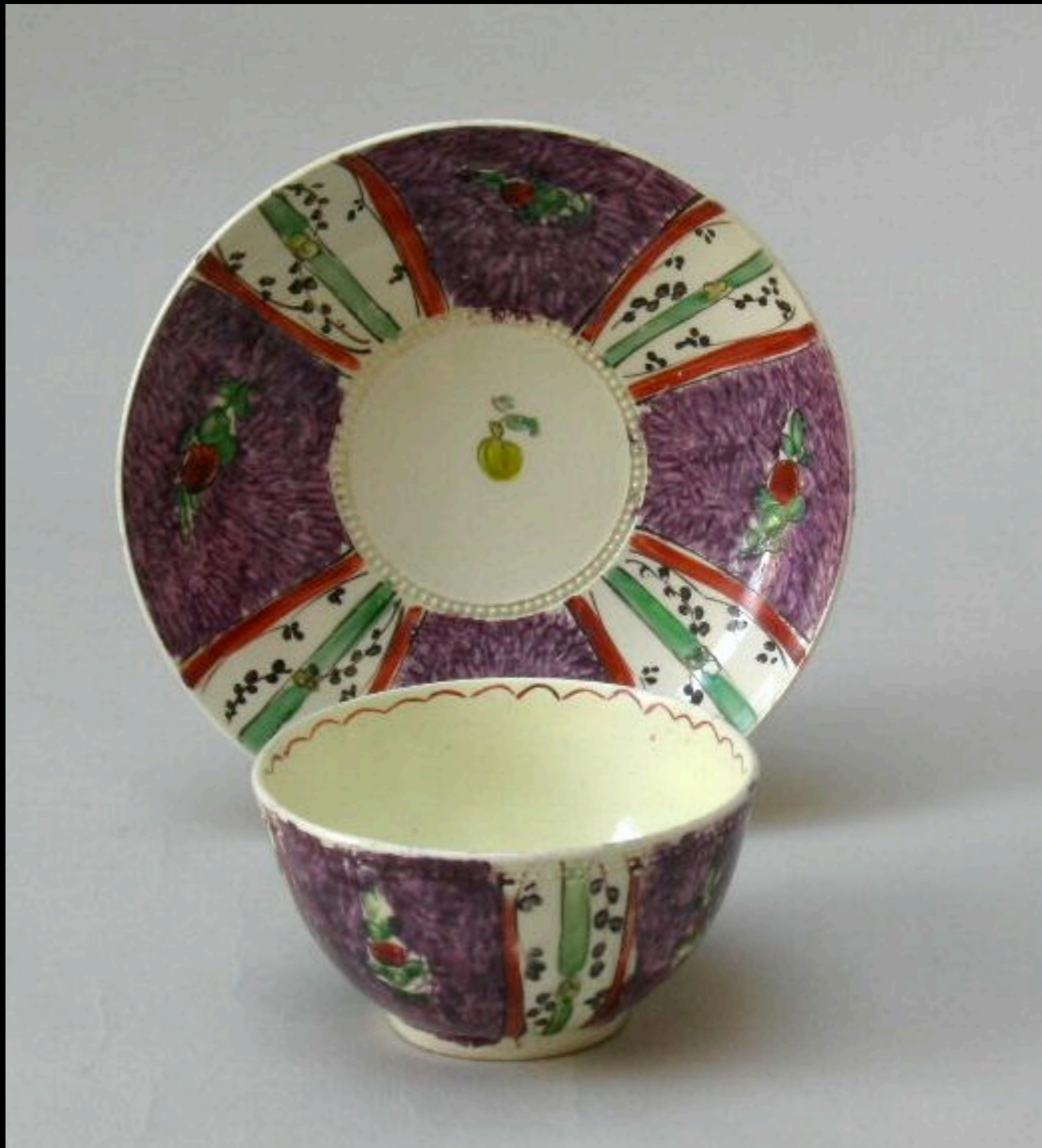
English Lead Glazed Earthenware / Creamware Chintz Cup and Saucer from Staffordshire