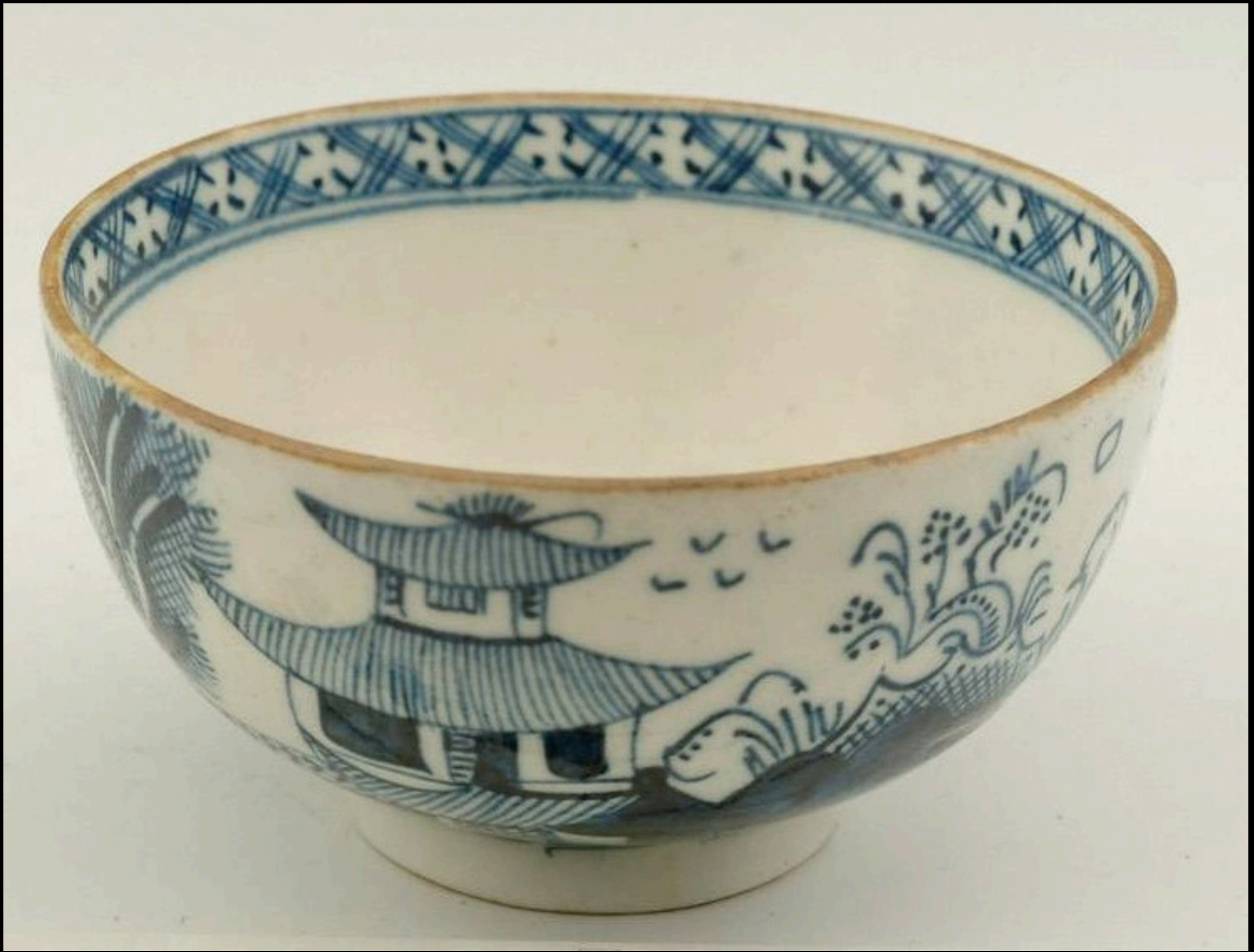
English Soft Paste Porcelain Tea Cup from Suffolk Lowestoft c. 1765 - 1775 (Museum of London)