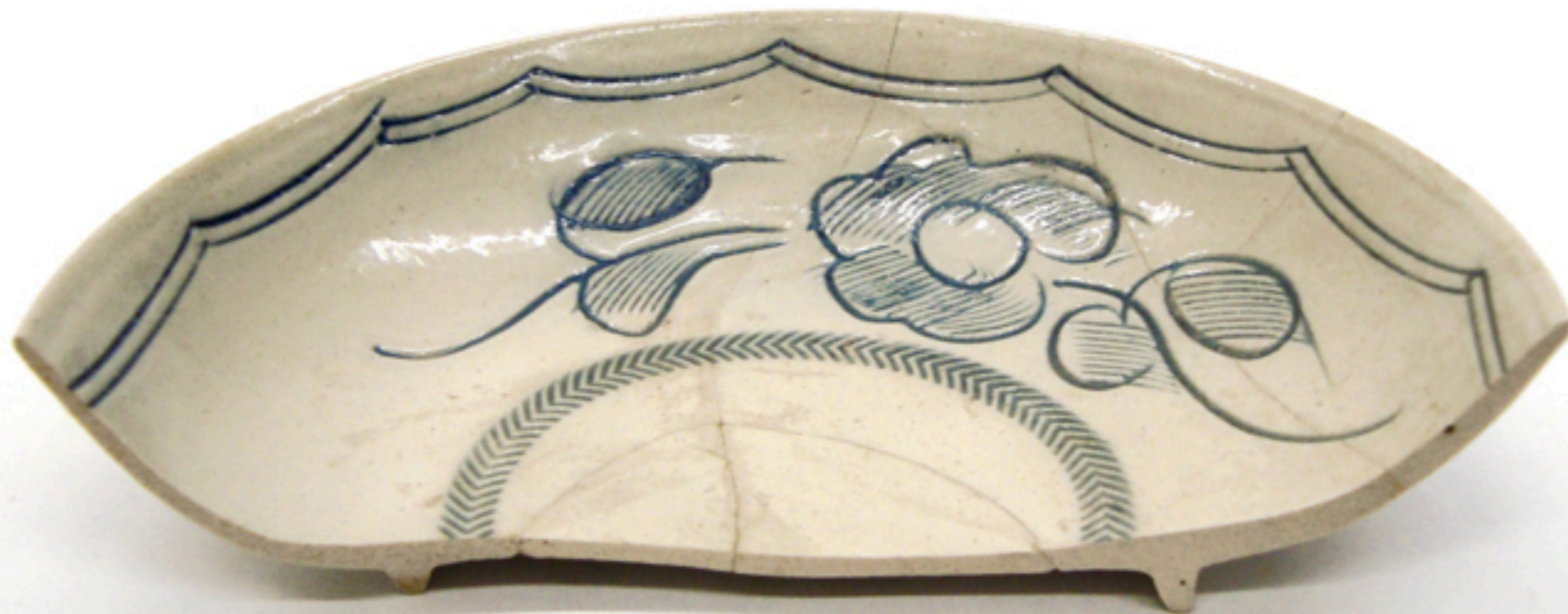
English Scratch Blue Stoneware Tea Saucer Excavated from a Privy at the Three Cranes Tavern, Charlestown, Massachusetts Burned by the British on June 17, 1775 c. 1770 (City of Boston Archeology Program)