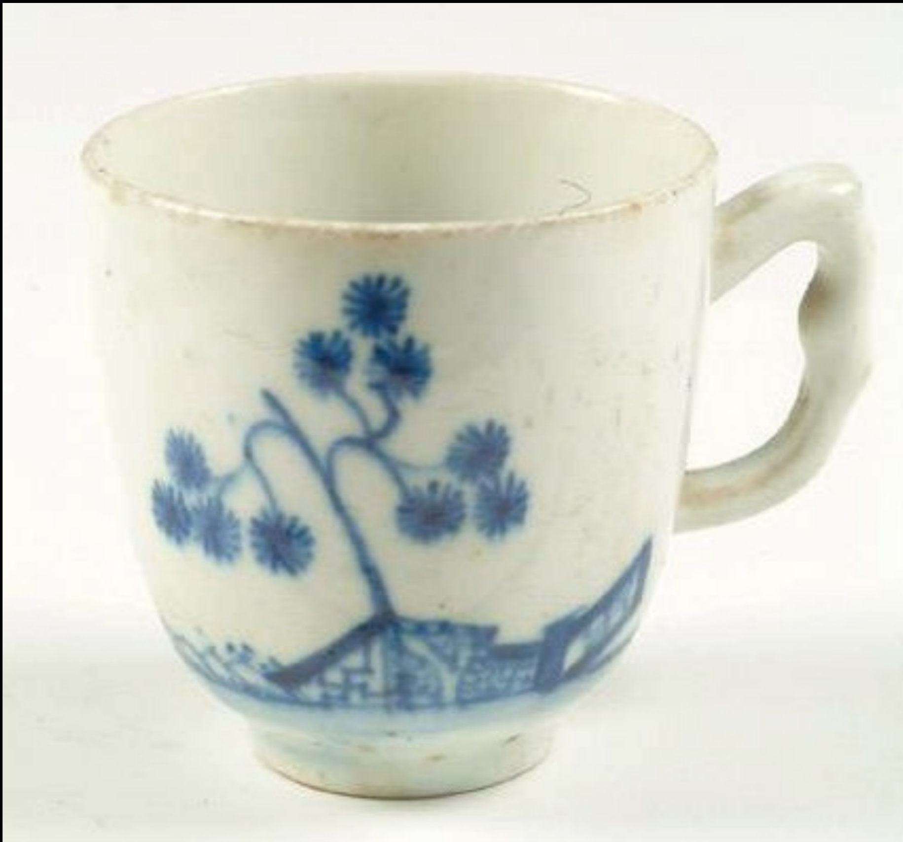
English Soft Paste Porcelain Tea Cup c. 1701 - 1800 (Museum of London)