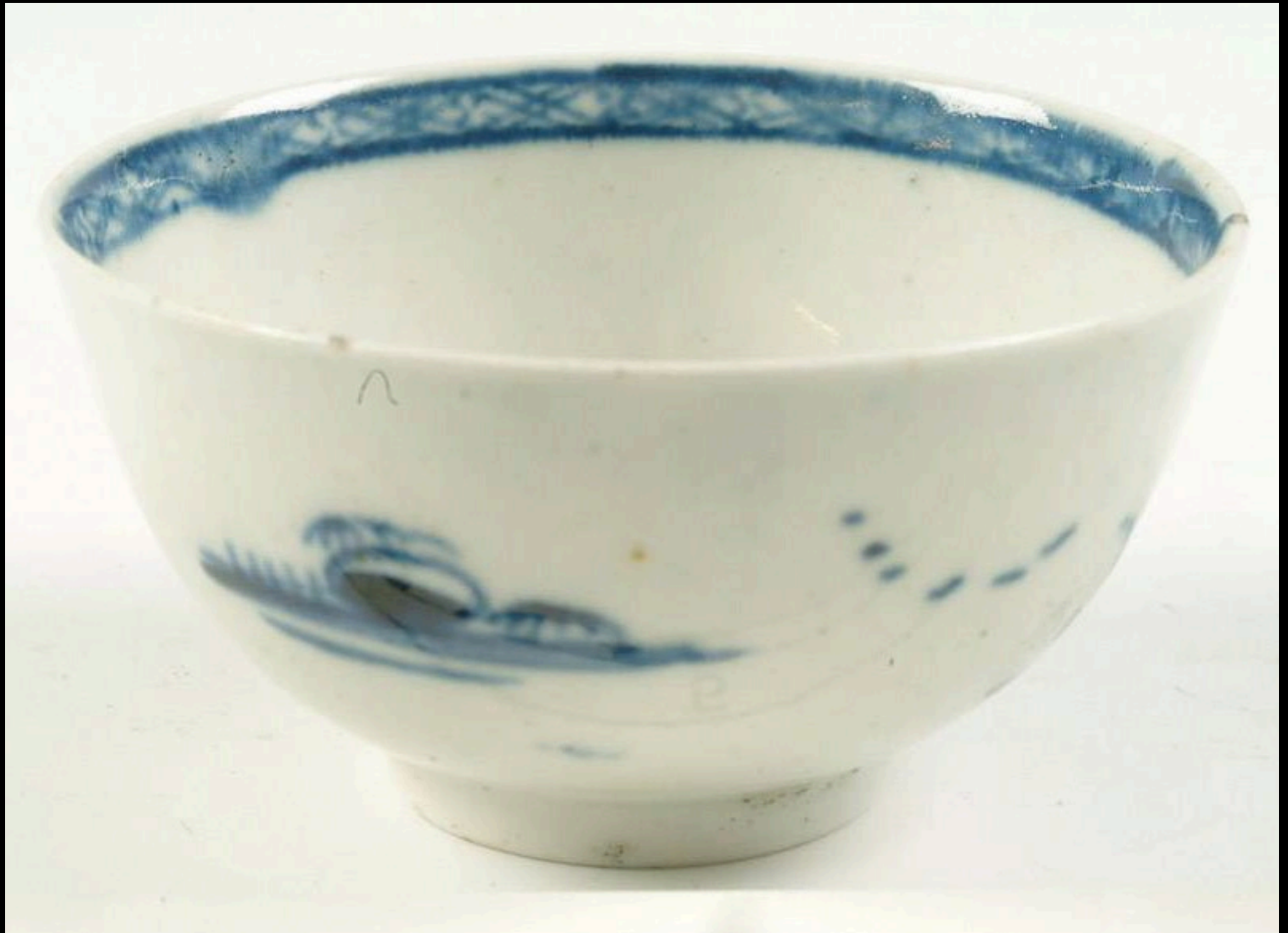
English Soft Paste Porcelain Tea Cup from Liverpool c. 1765 - 1785 (Museum of London)