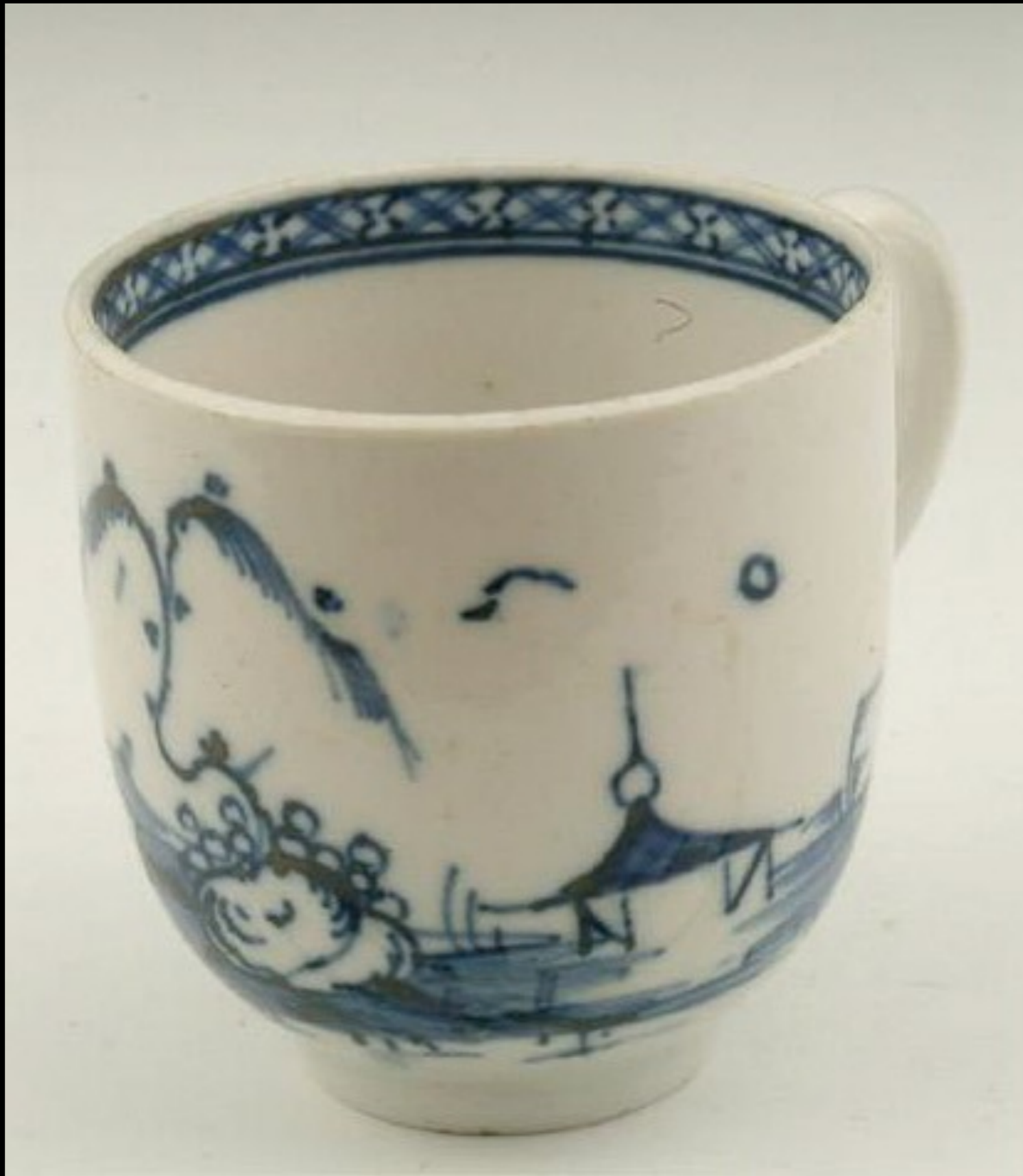
English Hard Paste Porcelain Tea Cup from Plymouth c. 1767 - 1770 (Museum of London)