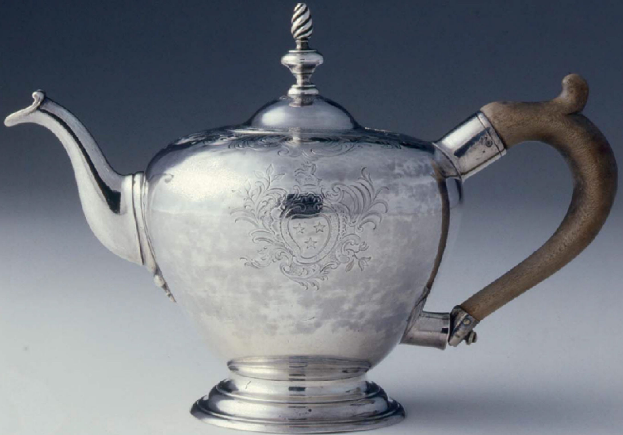
American Silver Teapot from Massachusetts by Nathaniel Hurd c. 1755 - 1760 (Museum of Fine Arts, Boston)