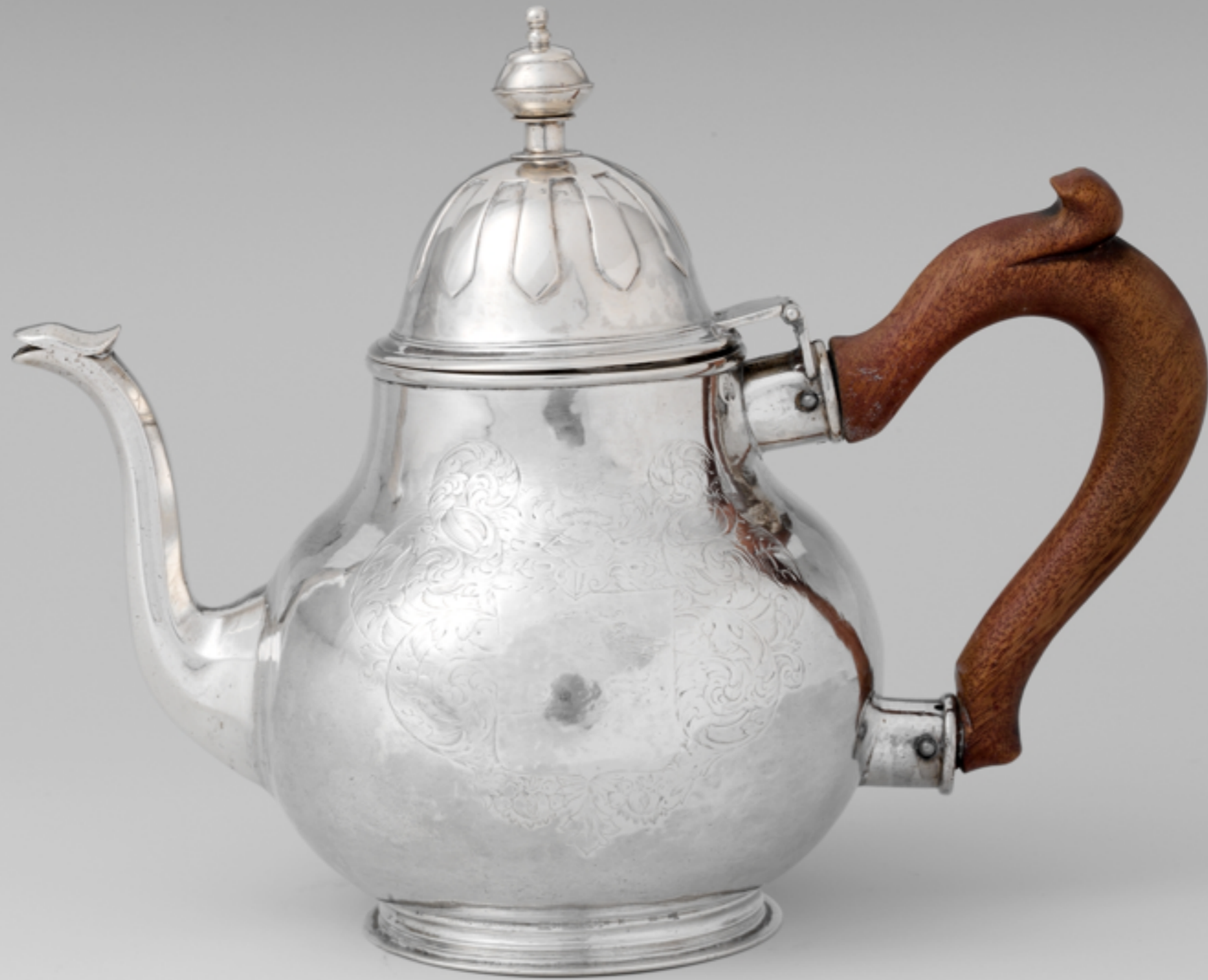
American Silver Teapot from New York, New York by Peter Van Dyck c. 1720 (Metropolitan Museum of Art)