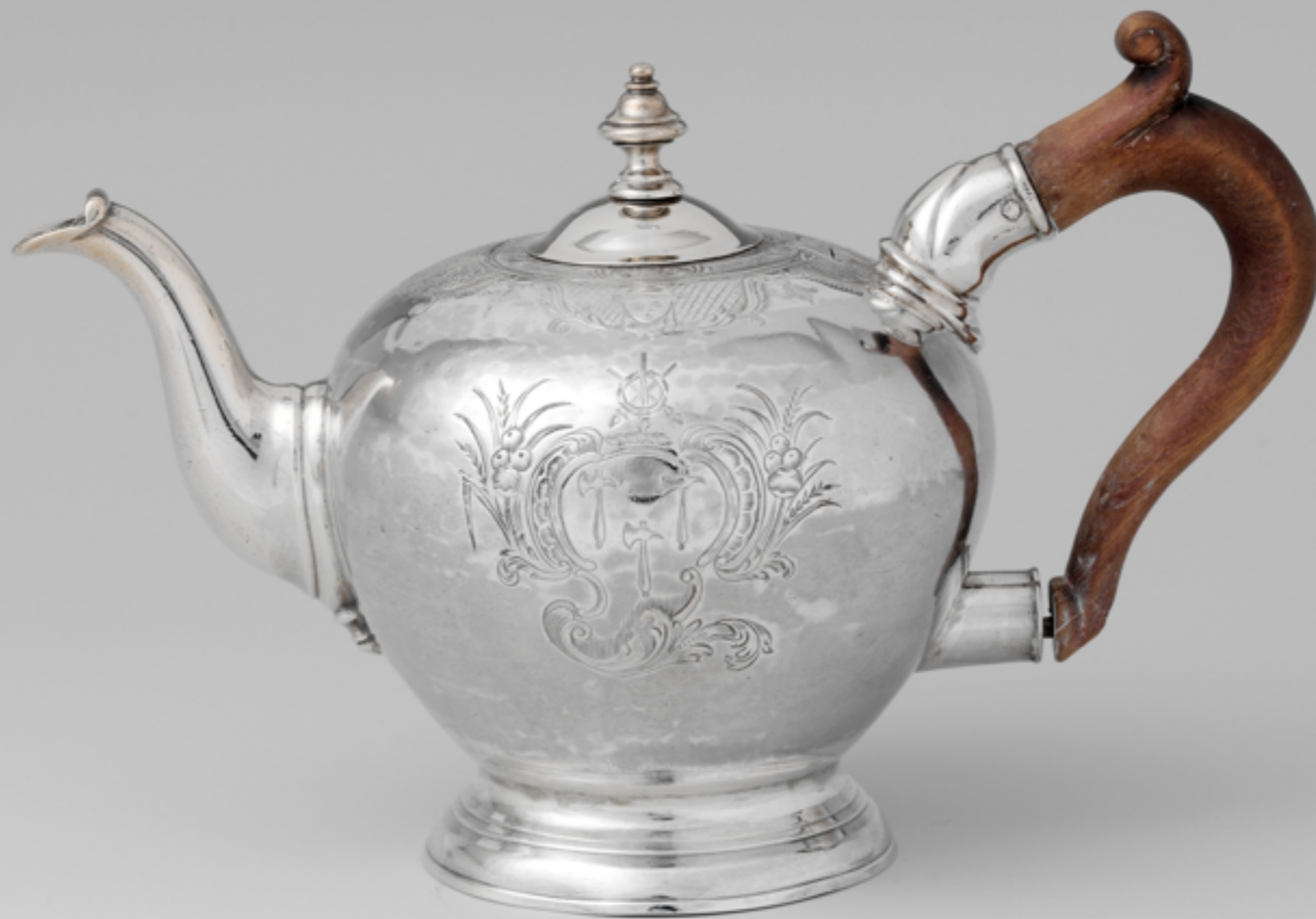
American Silver Teapot, Possibly from Boston, Massachusetts c. 1735 - 1755 (Metropolitan Museum of Art)