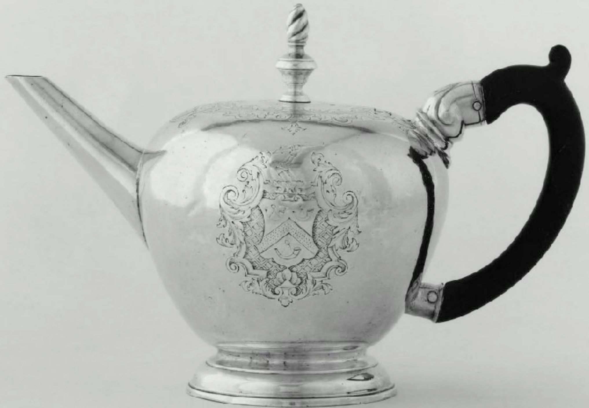
American Silver Teapot from Boston, Massachusetts by Paul Revere, Sr. c. 1740 (Museum of Fine Arts, Boston)