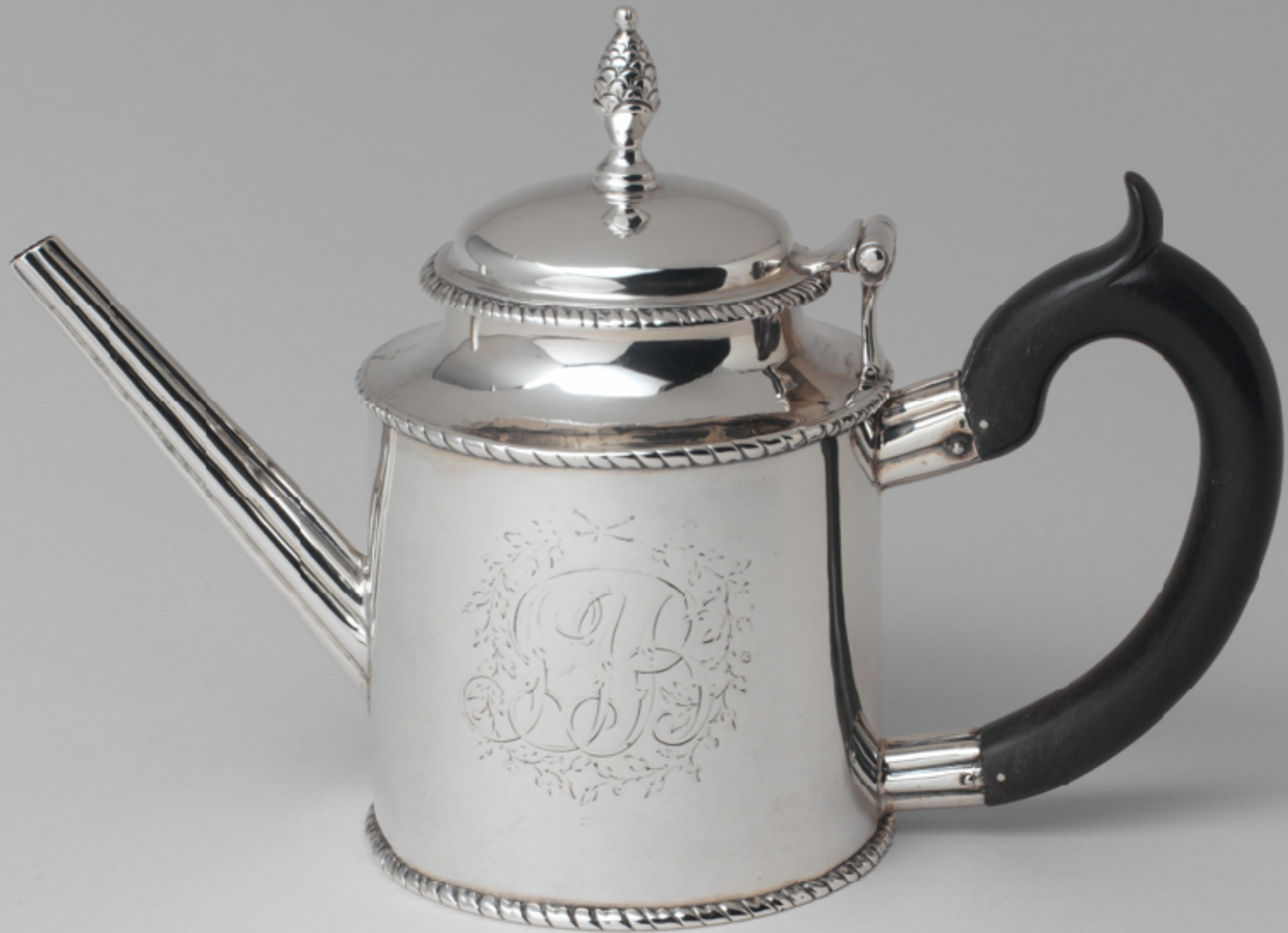
American Silver Teapot from Boston, Massachusetts by Paul Revere, Jr. 1782 (Metropolitan Museum of Art)