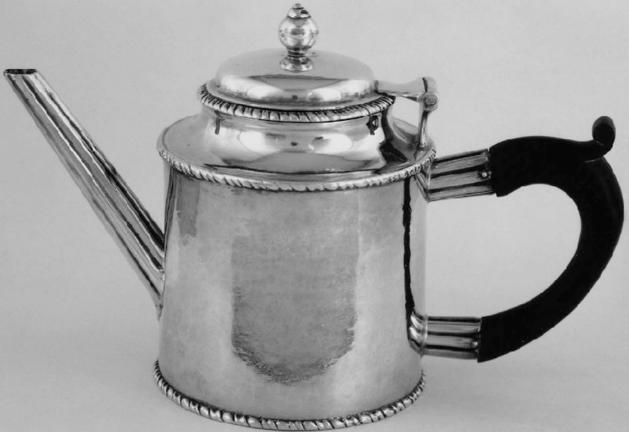
American Silver Teapot from Boston, Massachusetts by Paul Revere, Jr. 1782 (Museum of Fine Arts, Boston)