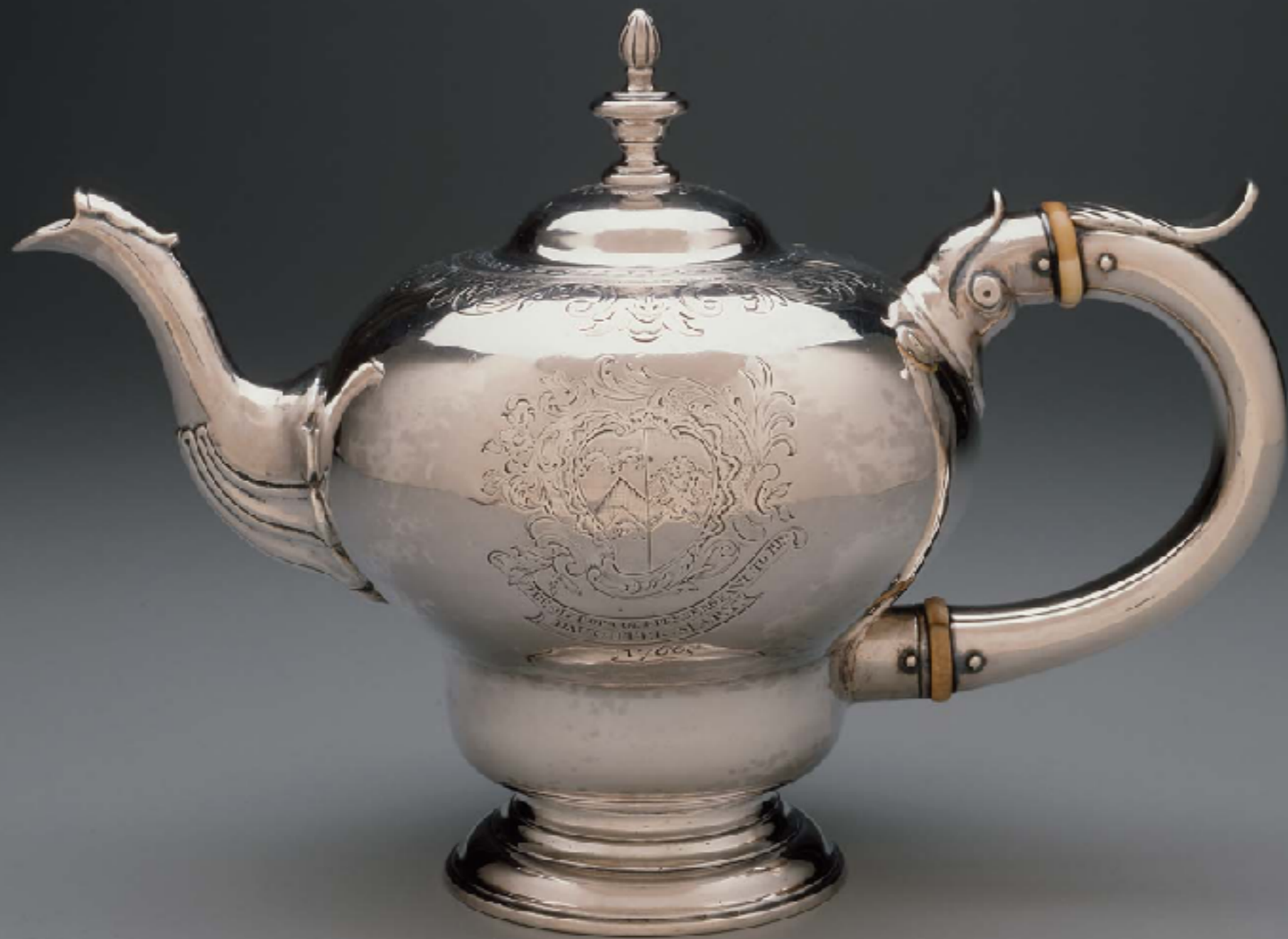
American Silver Teapot from Boston, Massachusetts by Zachariah Brigden 1760 (Museum of Fine Arts, Boston)