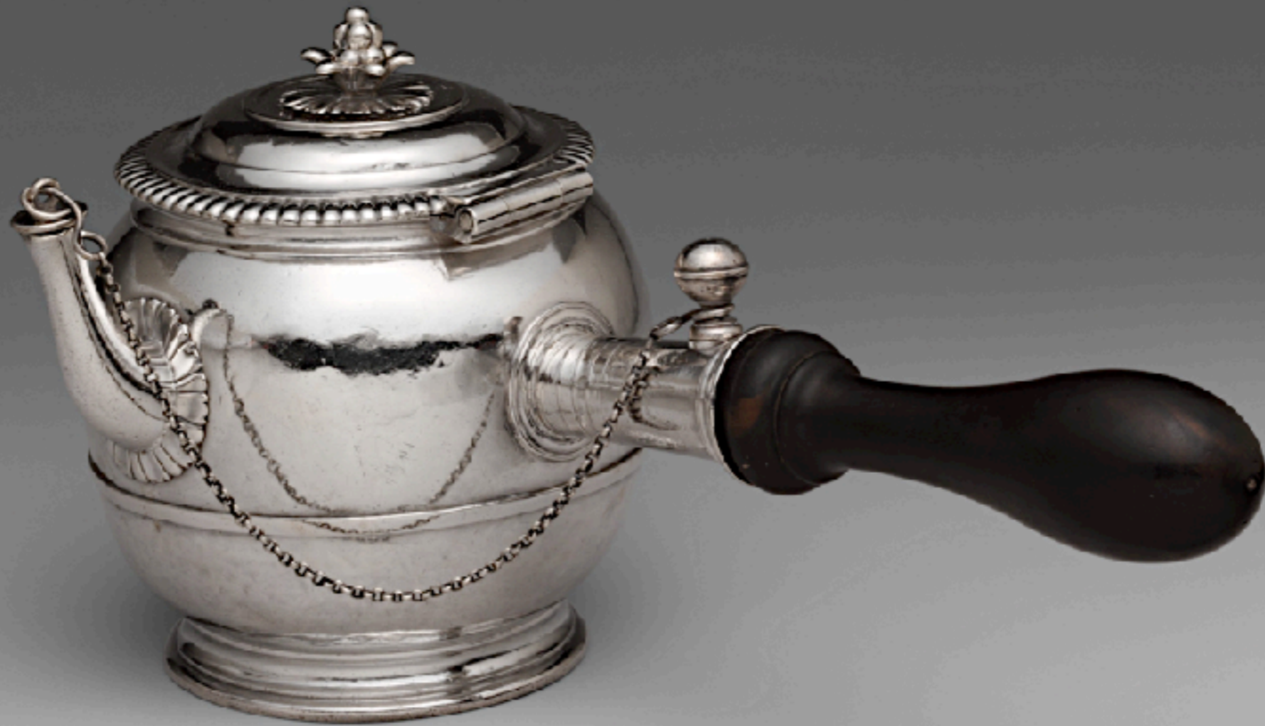
French Silver Teapot c. 1699 - 1700 (Metropolitan Museum of Art)