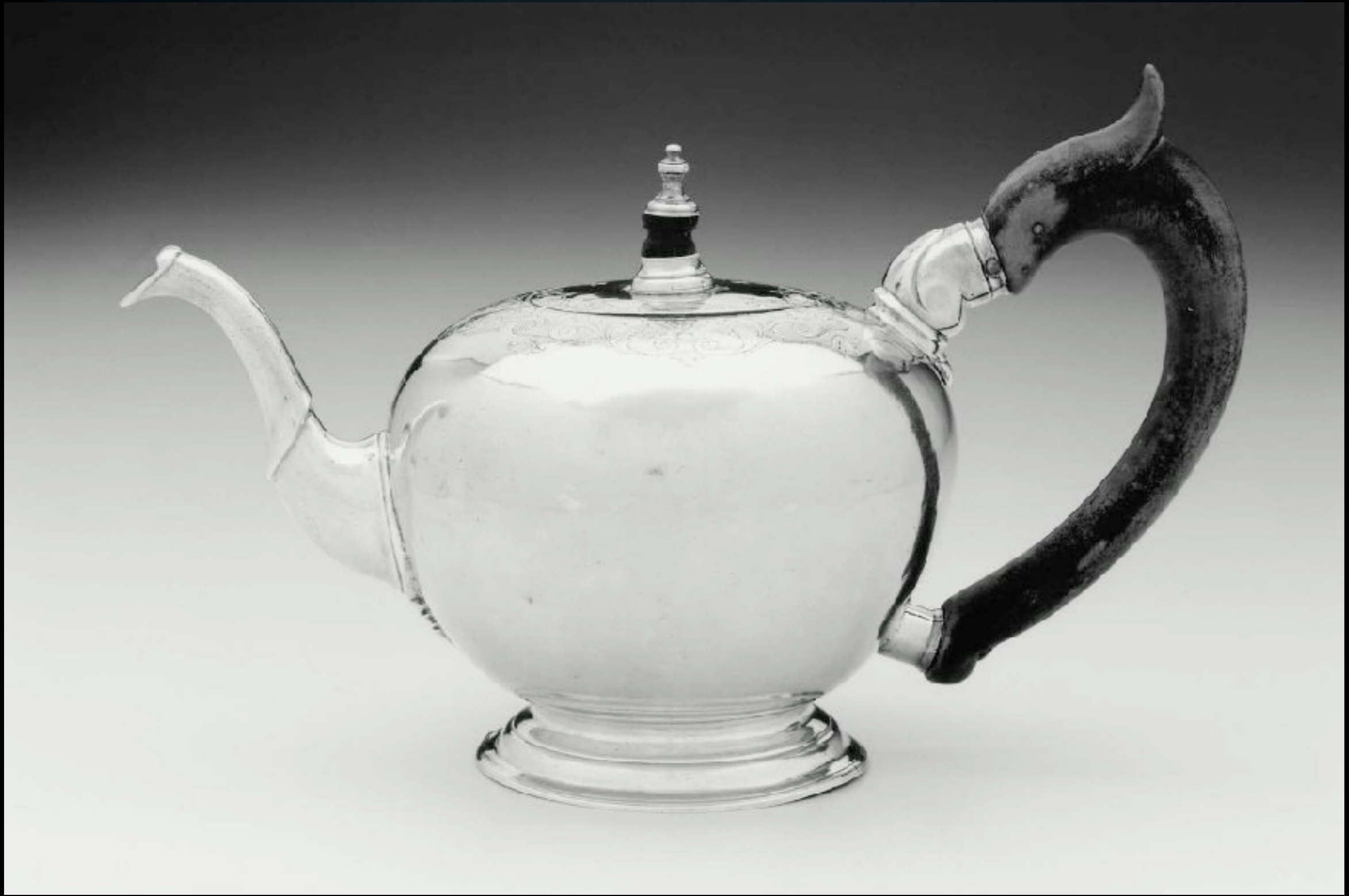
American Silver Teapot from Boston, Massachusetts by Paul Revere, Sr. c. 1730 (Museum of Fine Arts, Boston)