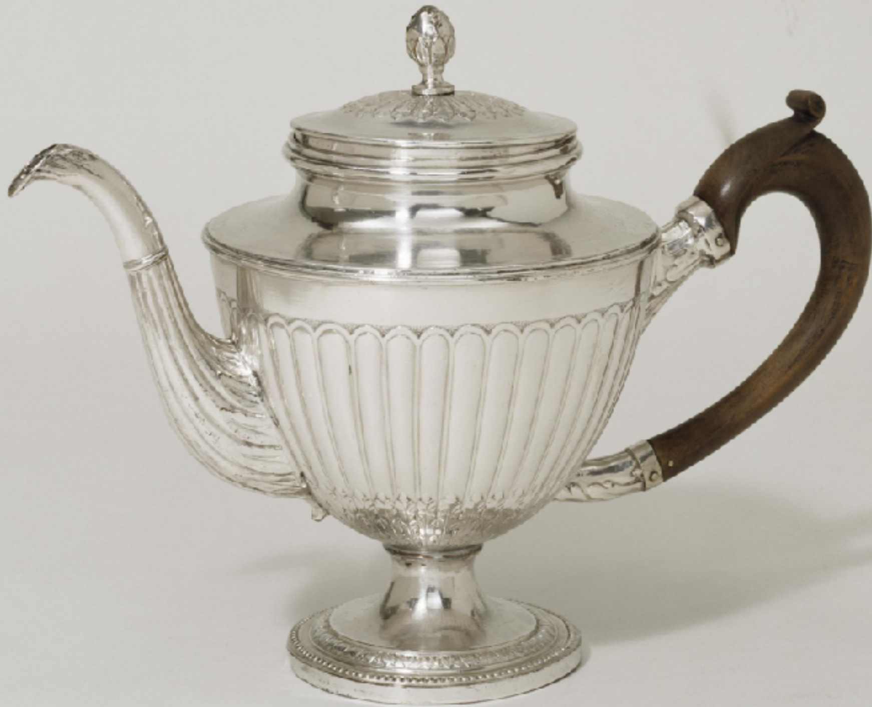
English Silver Teapot from Soho (Birmingham) by Matthew Boulton c. 1779