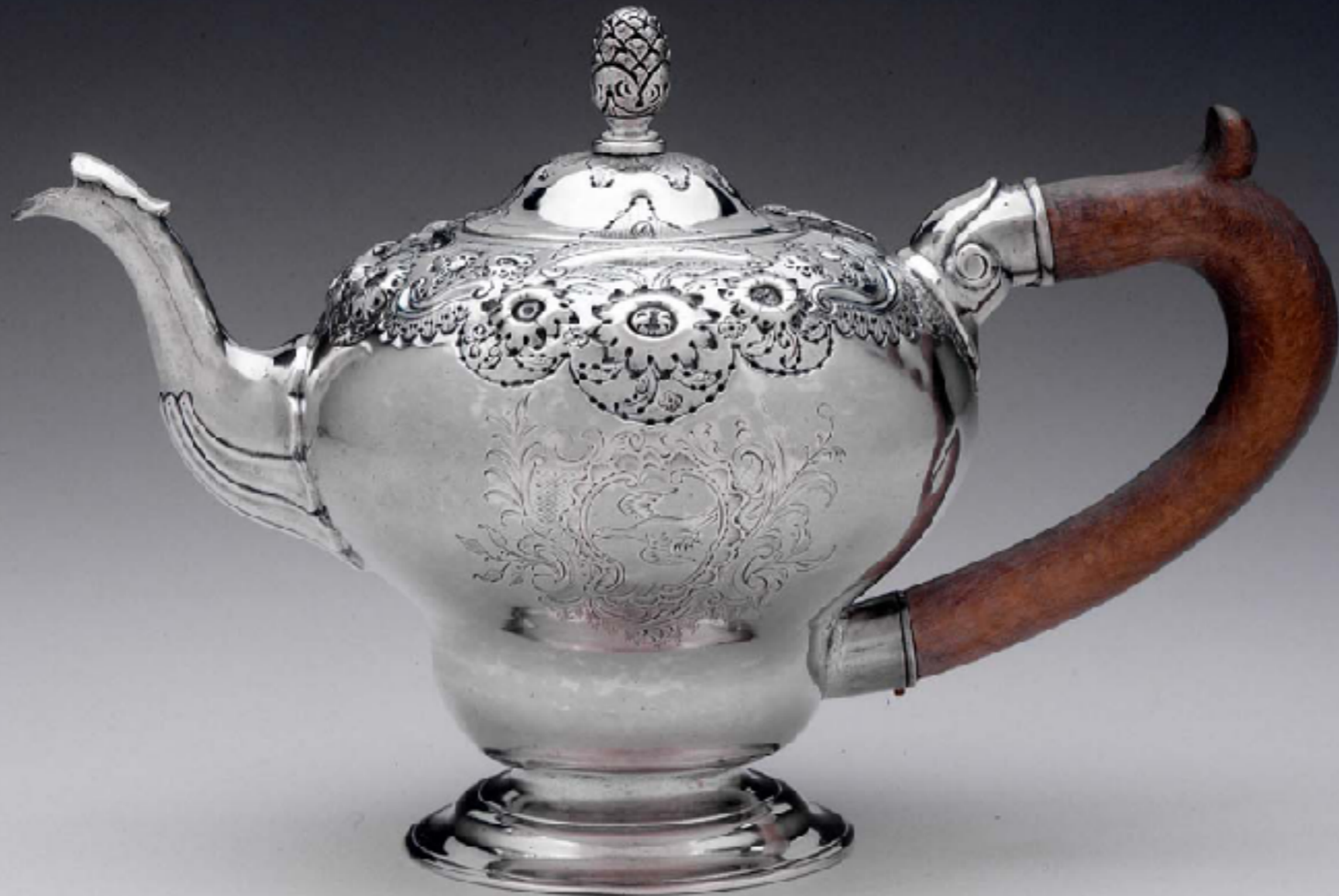
American Silver Teapot from Boston, Massachusetts by Benjamin Burt, Engraved by Nathaniel Hurd 1762 (Museum of Fine Arts, Boston)