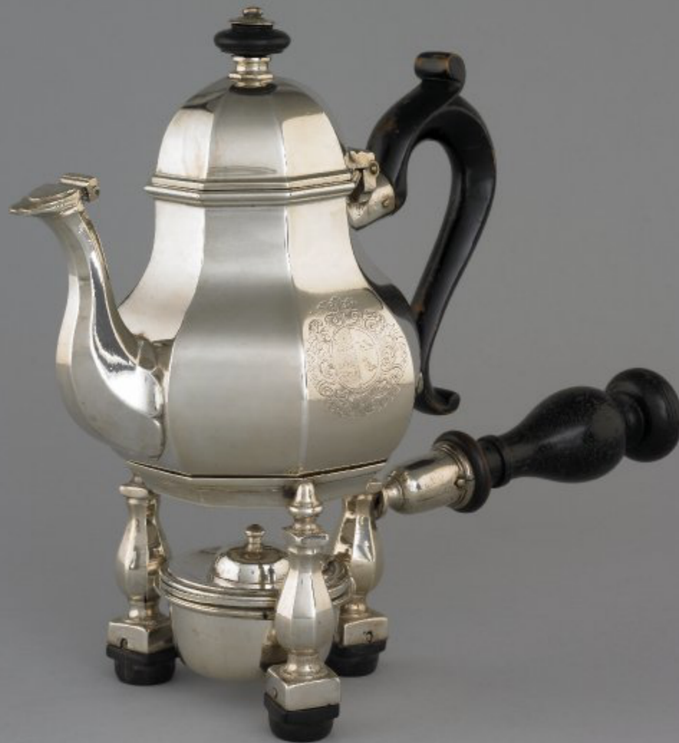
English Silver Teapot & Stand from London by Louis Cuny 1706 (The British Museum)