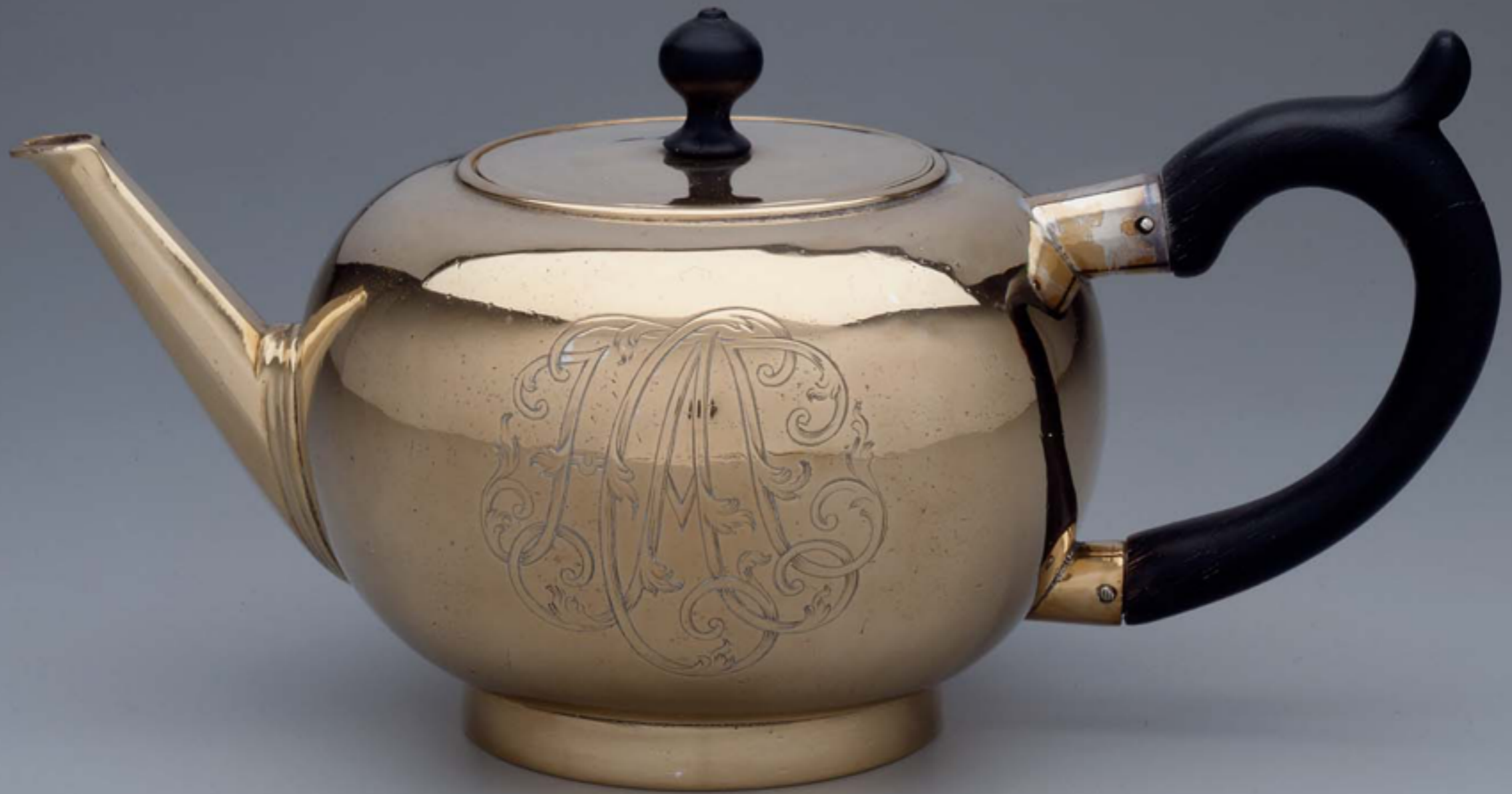
English Brass Teapot c. 1730 (Museum of Fine Arts, Boston)