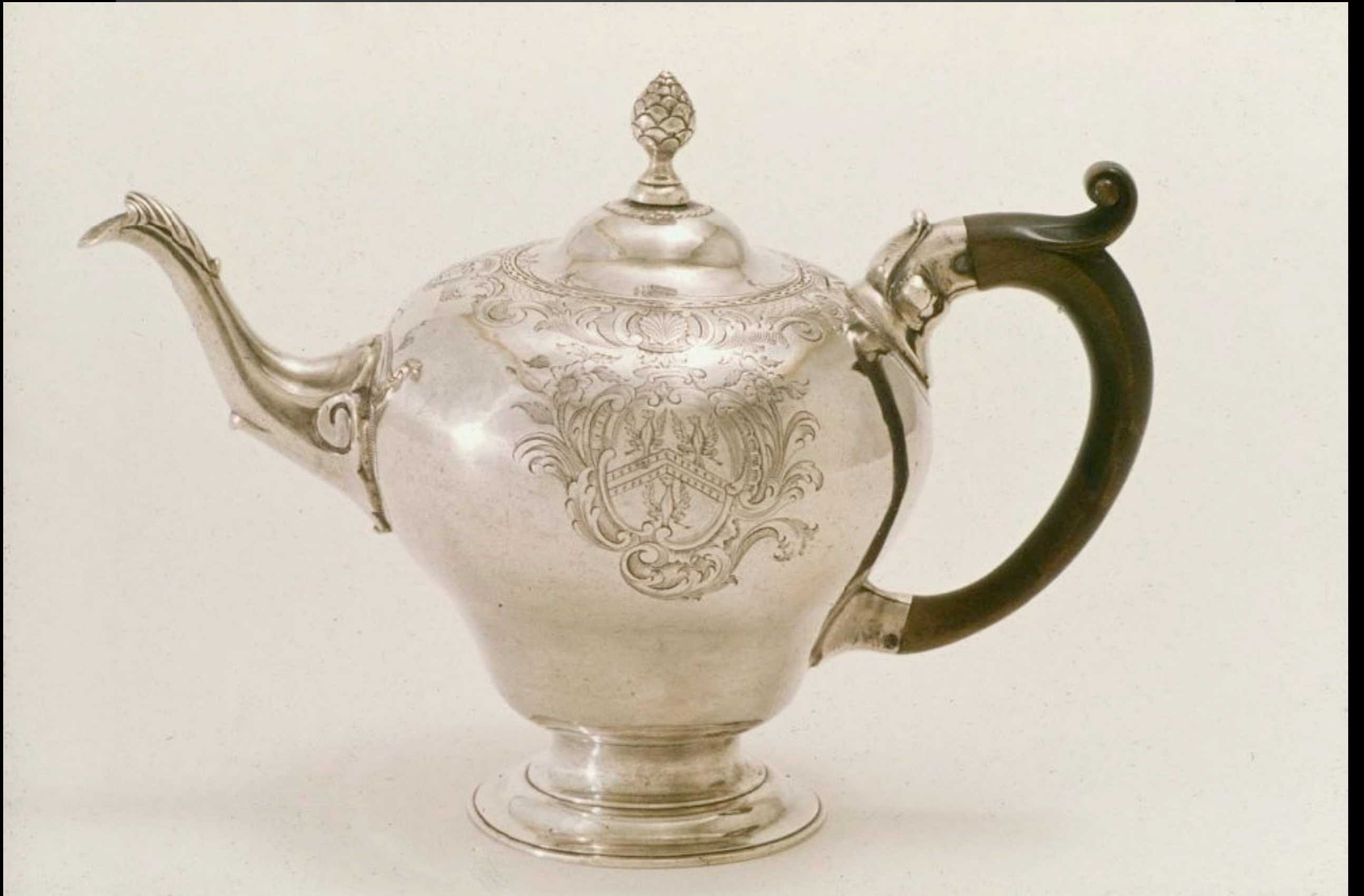
American Silver Teapot from Boston, Massachusetts by Paul Revere, Jr. c. 1770 (Museum of Fine Arts, Boston)