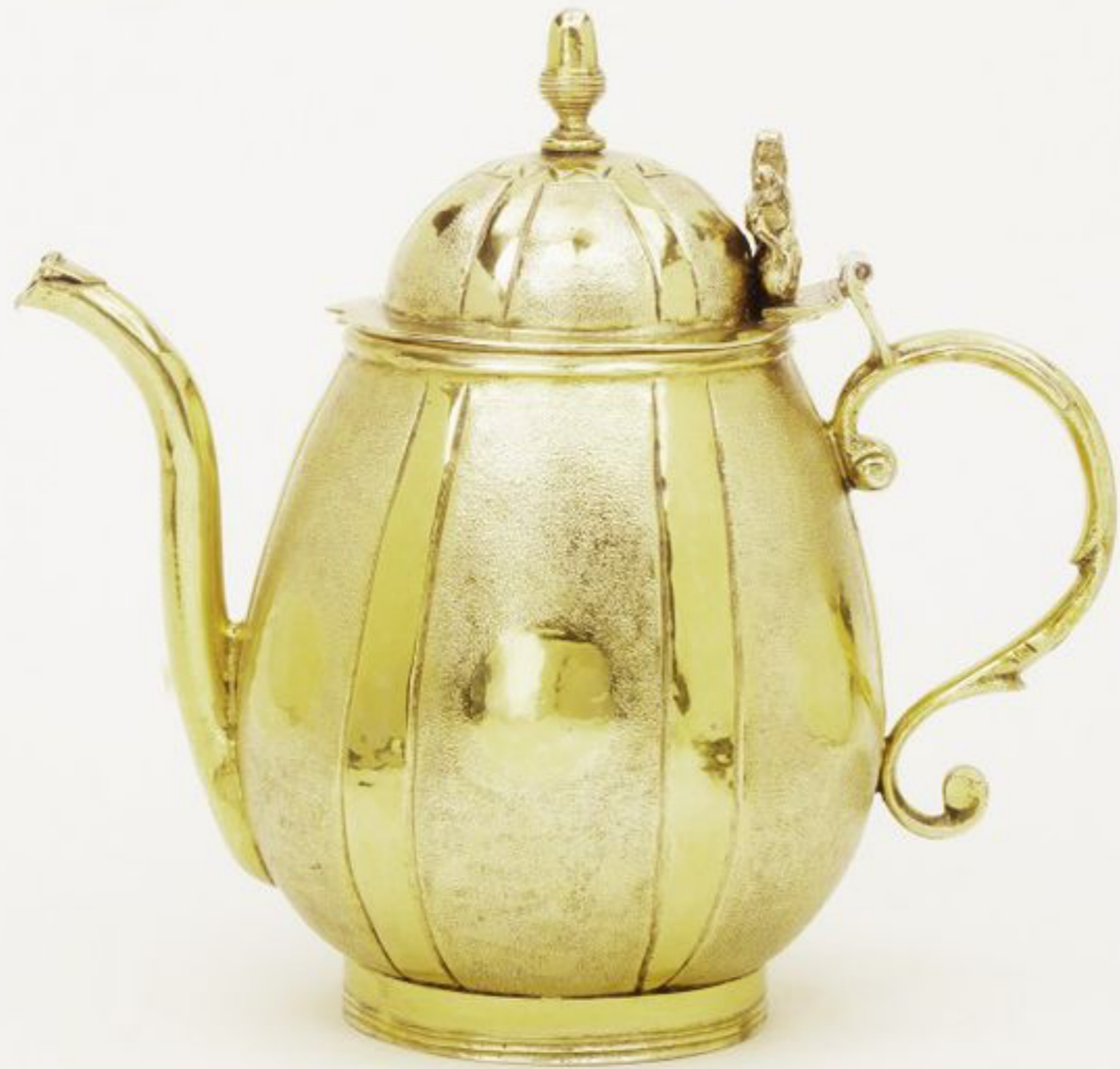
English Silver Gilt Teapot from London 1685 (Victoria & Albert)