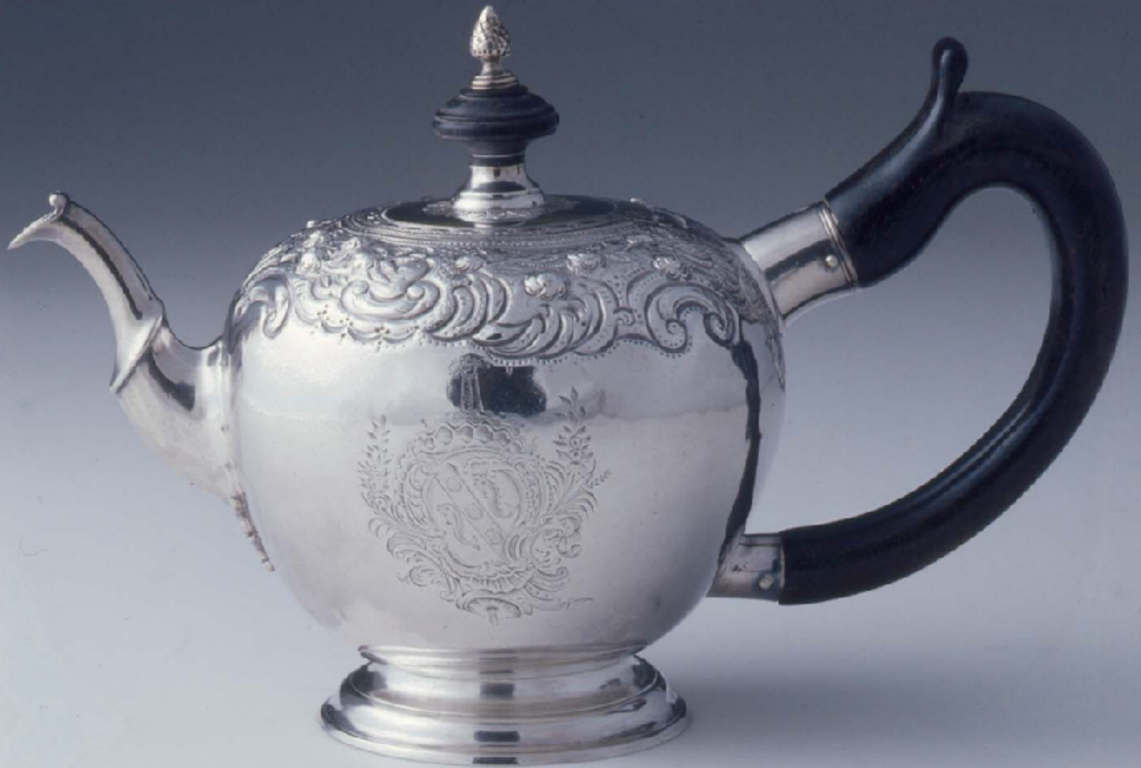
American Silver Teapot from Boston, Massachusetts by Jacob Hurd c. 1750 (Museum of Fine Arts, Boston)