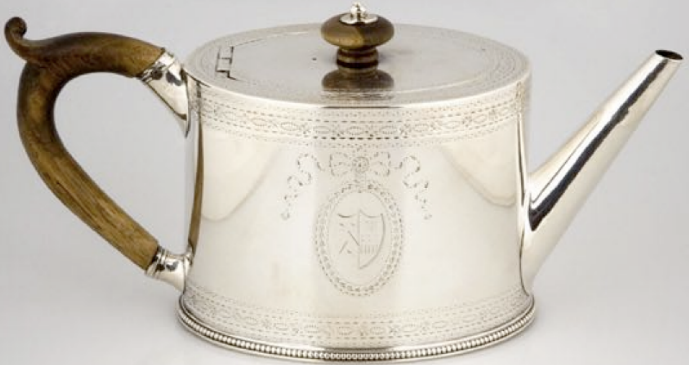
English Silver Teapot by Hester Bateman of London c. 1782 - 1783 (Private Collection)