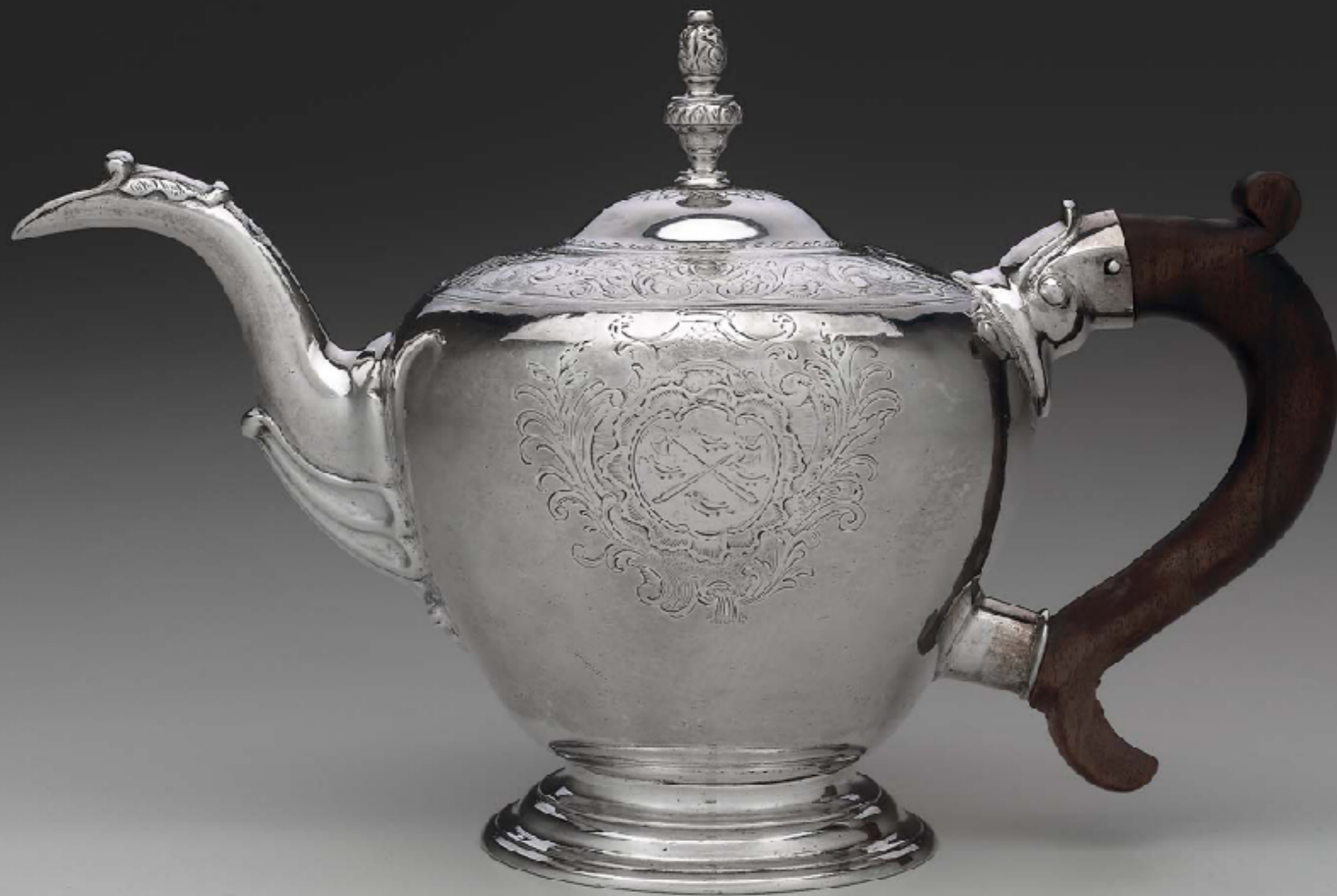
American Silver Teapot from Boston, Massachusetts by John Coburn 1762 (Museum of Fine Arts, Boston)