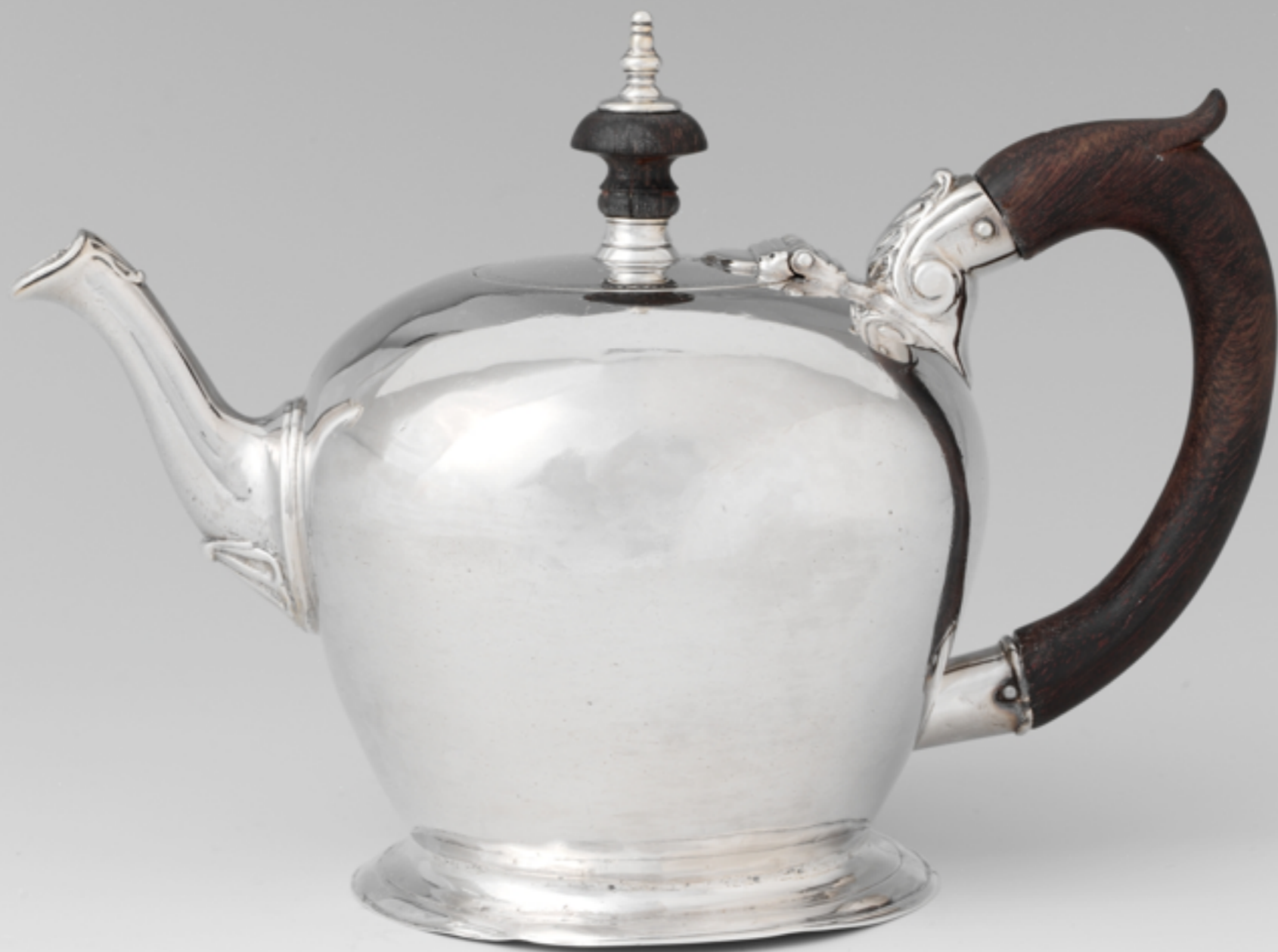
American Silver Teapot from Philadelphia, Pennsylvania by Joseph Richardson, Sr. c. 1740 (Metropolitan Museum of Art)