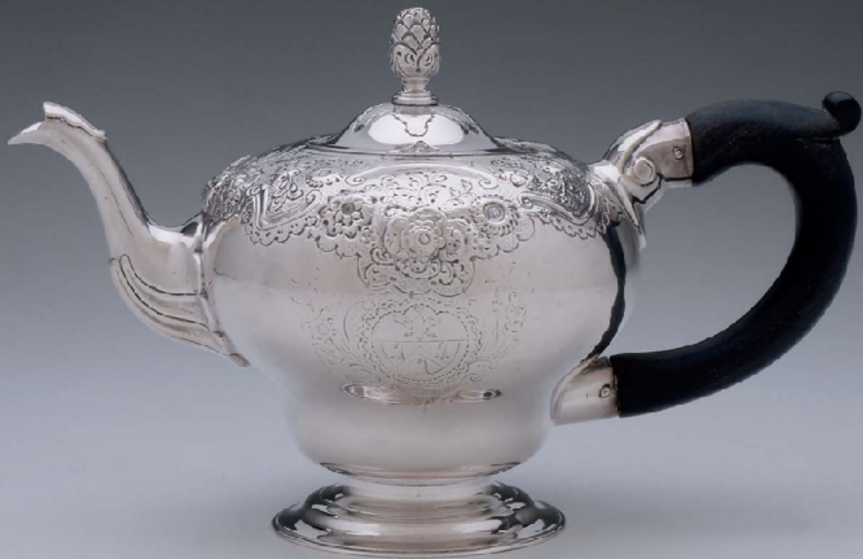
American Silver Teapot from Boston, Massachusetts by Benjamin Burt, Engraved by Nathaniel Hurd 1763 (Museum of Fine Arts, Boston)