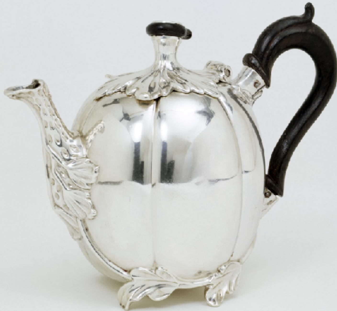
Dutch Silver Teapot c. 1750 (Victoria & Albert)