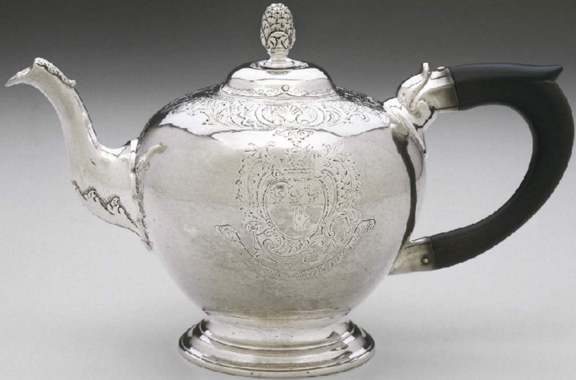
American Silver Teapot from Boston, Massachusetts by Samuel Minot c. 1760 (Museum of Fine Arts, Boston)