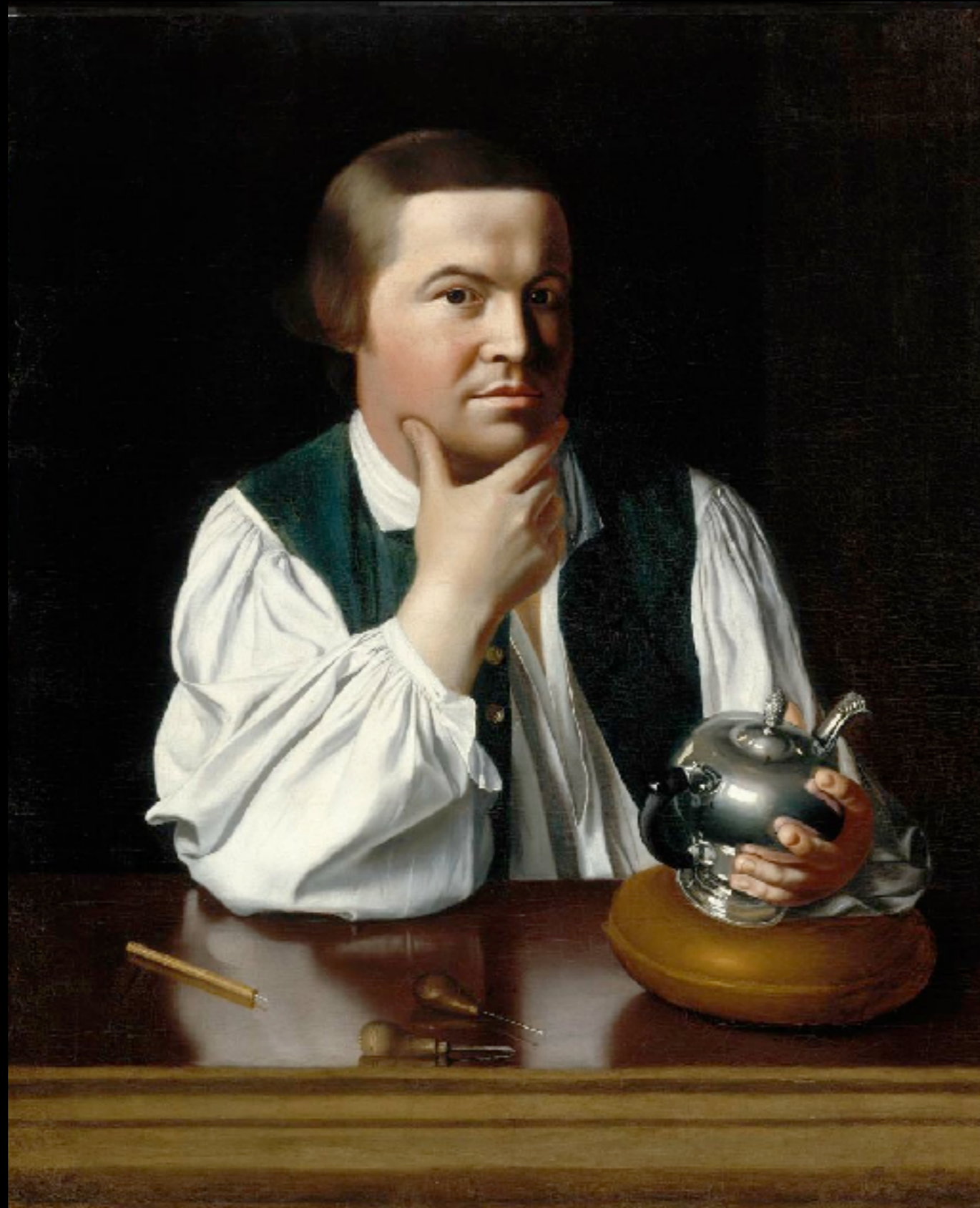
Paul Revere of Boston by John Singleton Copley 1768 (Museum of Fine Arts, Boston)