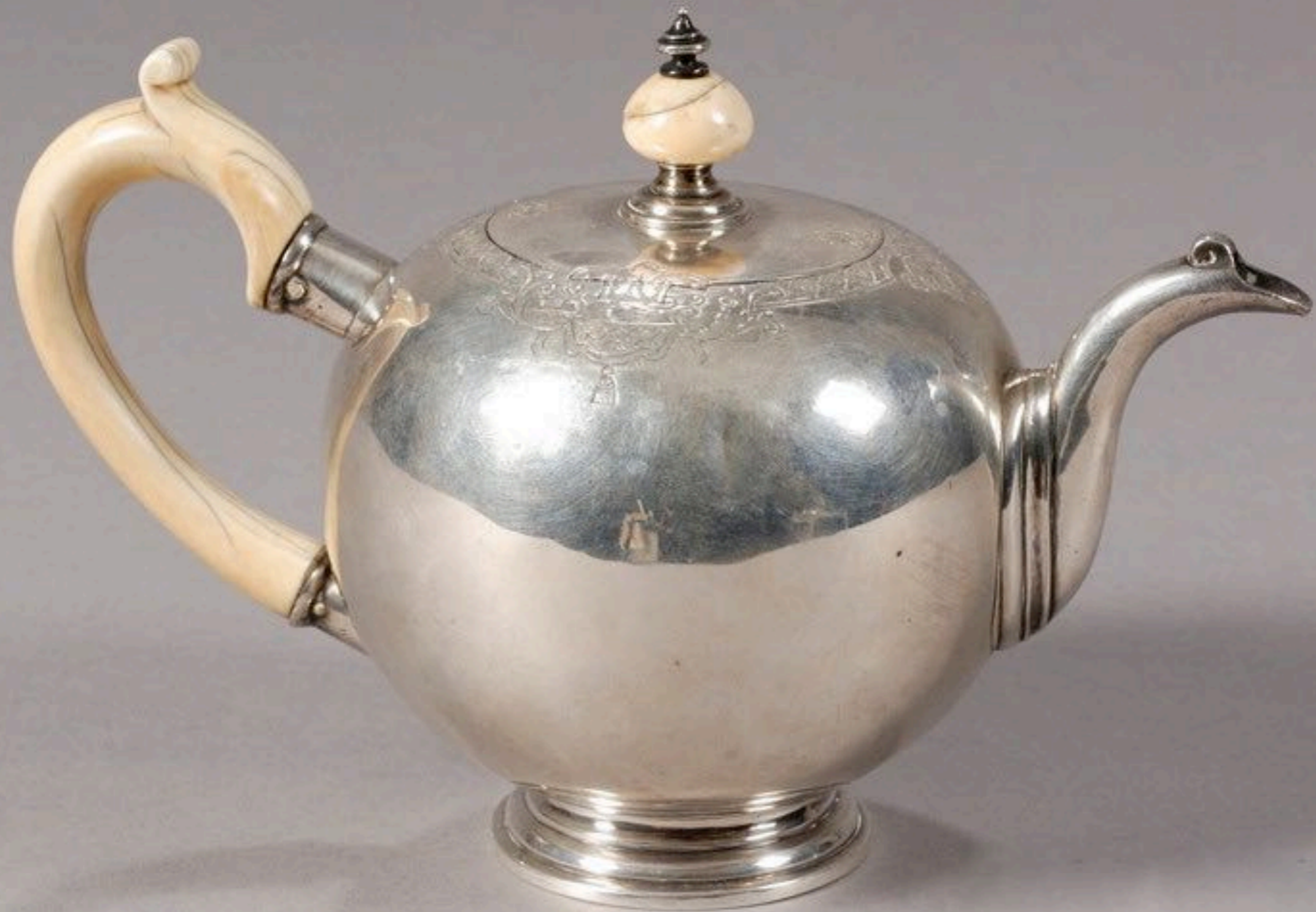
Dutch Silver Teapot c. 1740 (Private Collection)