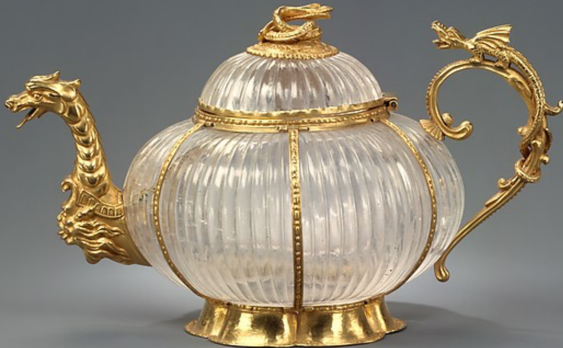
German Rock Crystal (c. 1700) and Gold Mounted (c. 1720) Teapot from Dresden