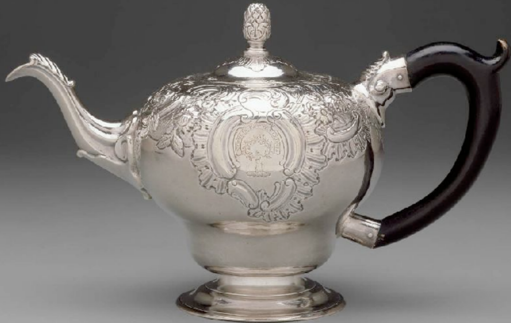
American Silver Teapot from Boston, Massachusetts by Paul Revere, Jr. c. 1760 - 1765 (Museum of Fine Arts, Boston)