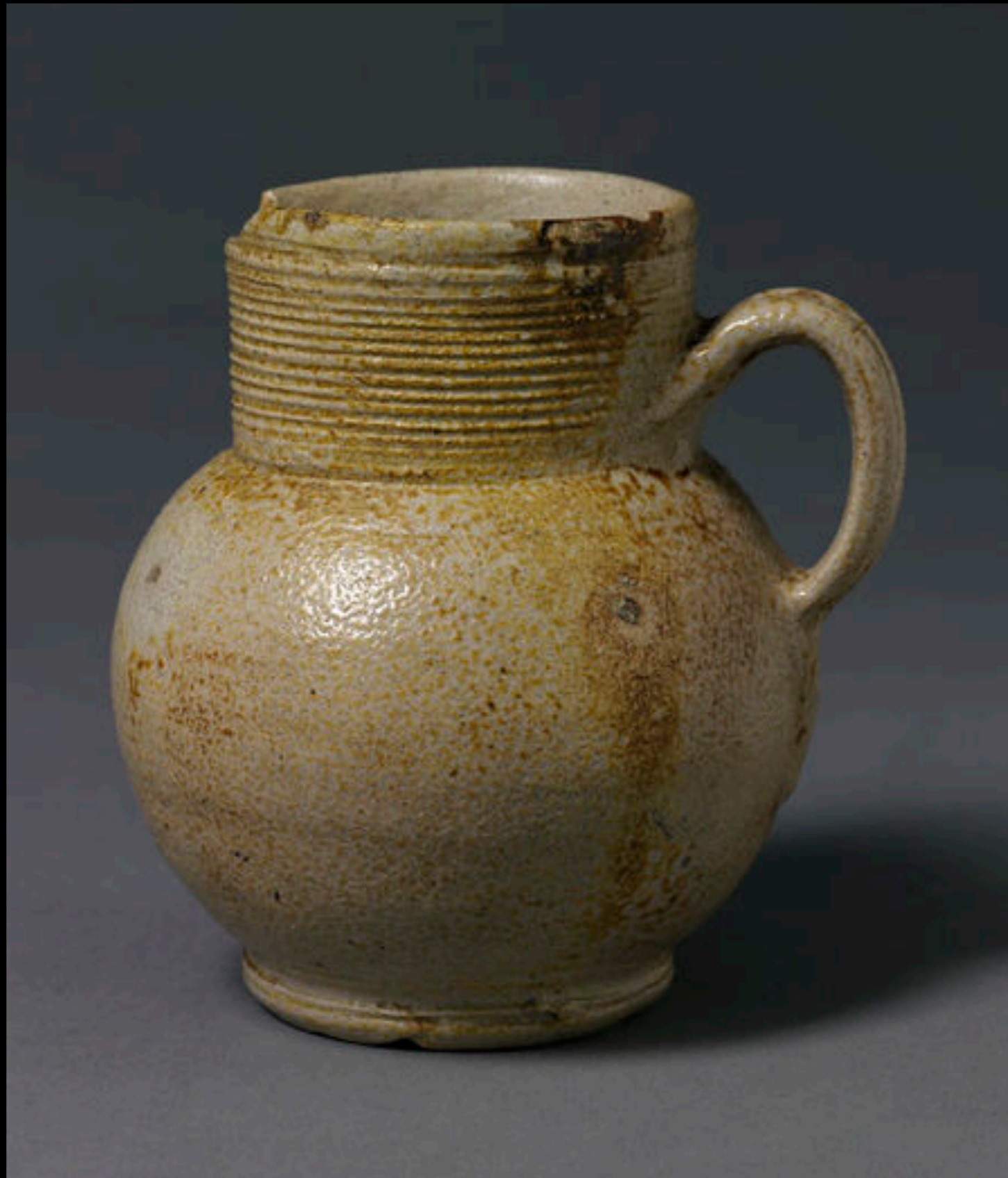
English Salt Glazed Stoneware "Gorge" Mug from Fulham c. 1680 - 1685 (Victoria & Albert)