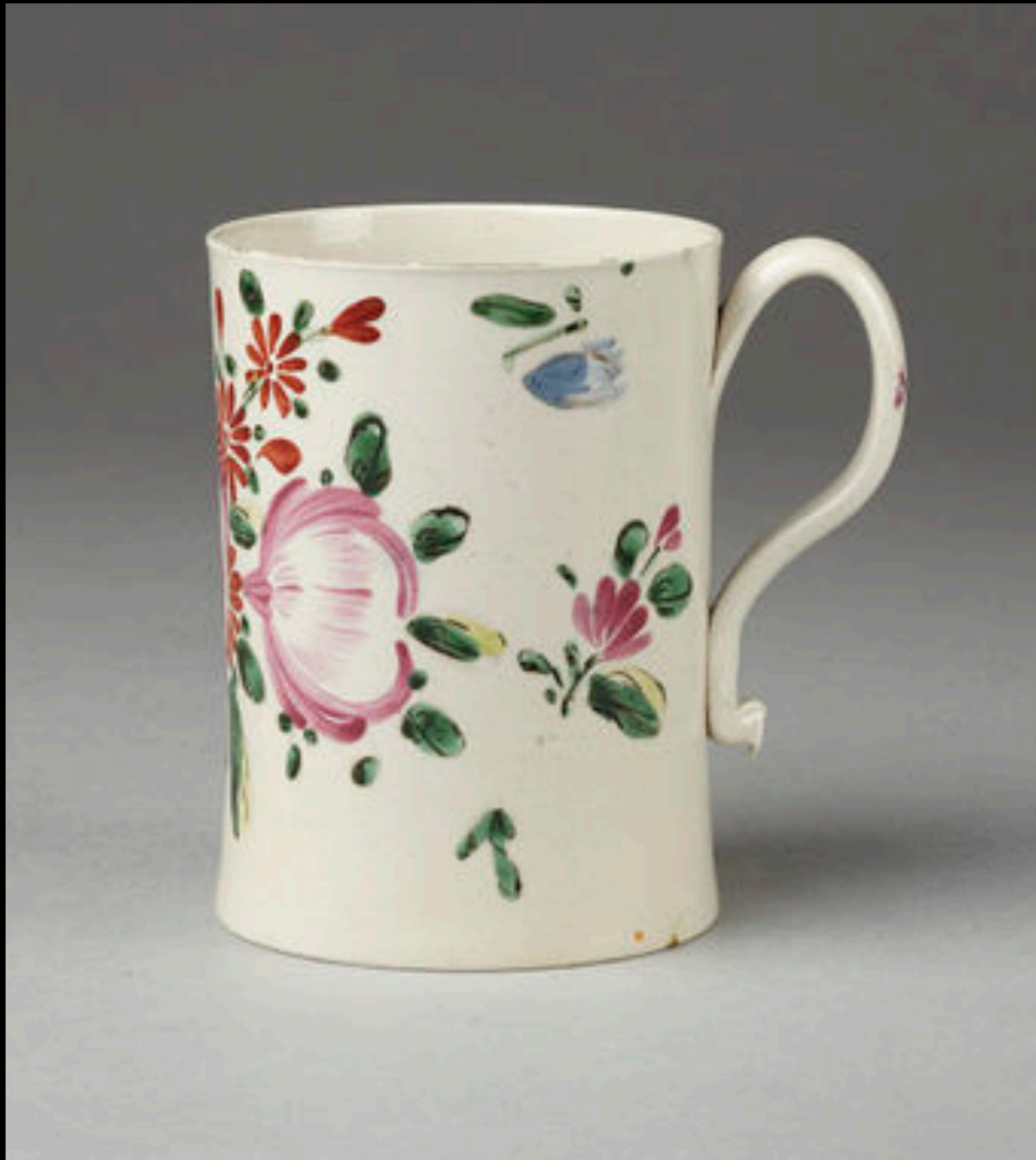
English Salt Glazed Stoneware Mug from Staffordshire