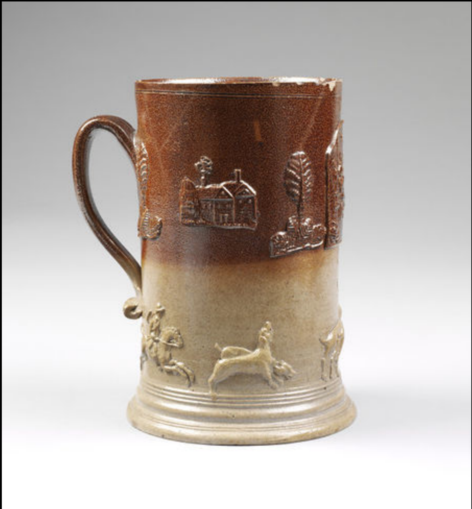
English Salt Glazed Stoneware Mug from Vauxhill