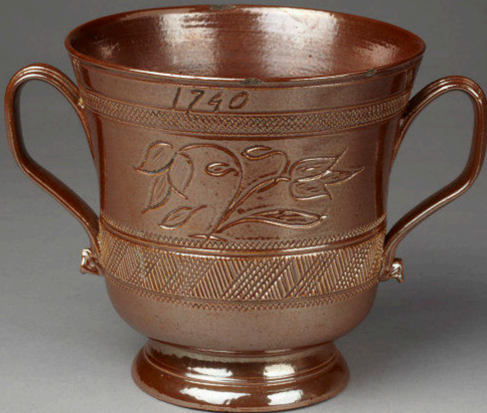
English Salt Glazed Loving Cup from Nottingham