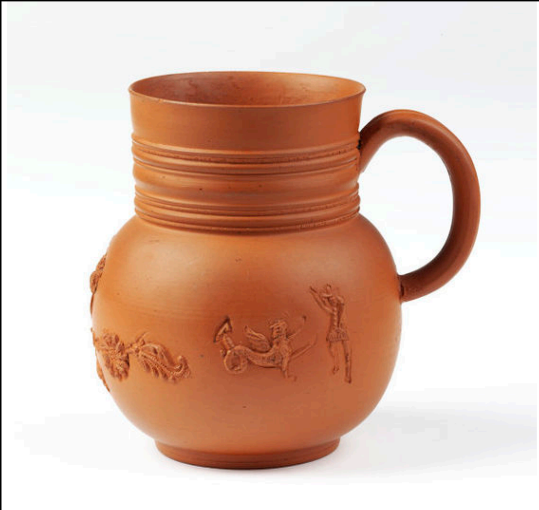
English Slip - Cast and Lathe - Turned Red Stoneware "Gorge" Mug from Bradell Wood c. 1690 - 1698 (Victoria & Albert)