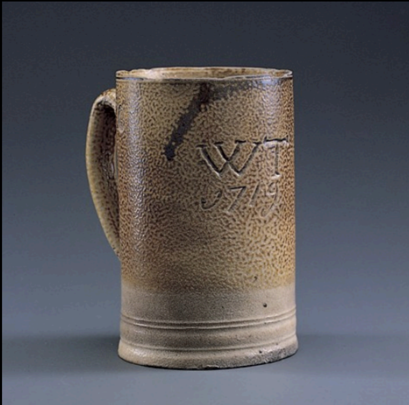
English Salt Glazed Stoneware Mug with “GR” Excise Stamp Within an Oval from Bristol (“GR” Stamps were only adopted by Stoneware Manufacturers from Bristol) 1719 (Chipstone)