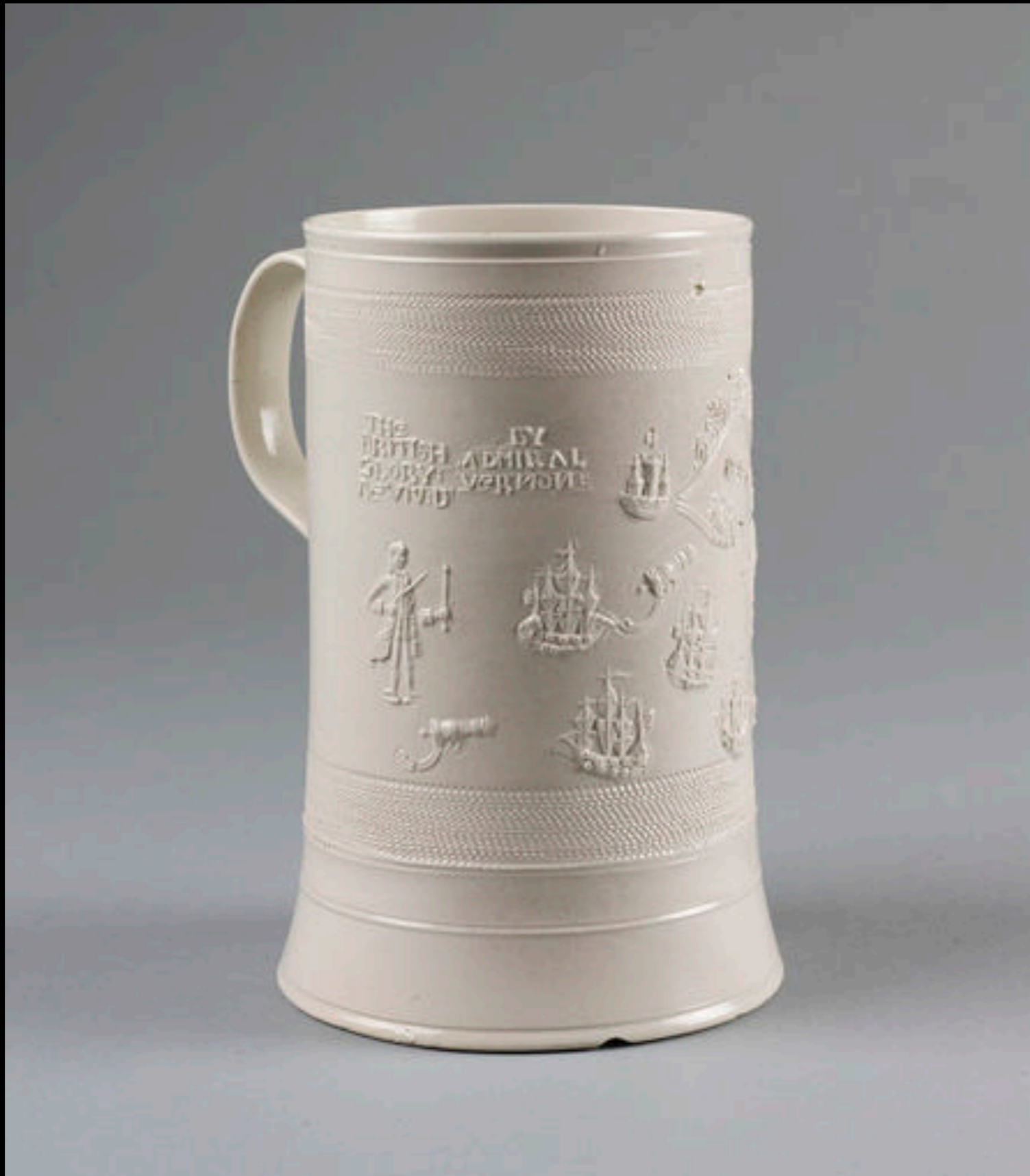
English Salt Glazed Tankard from Staffordshire