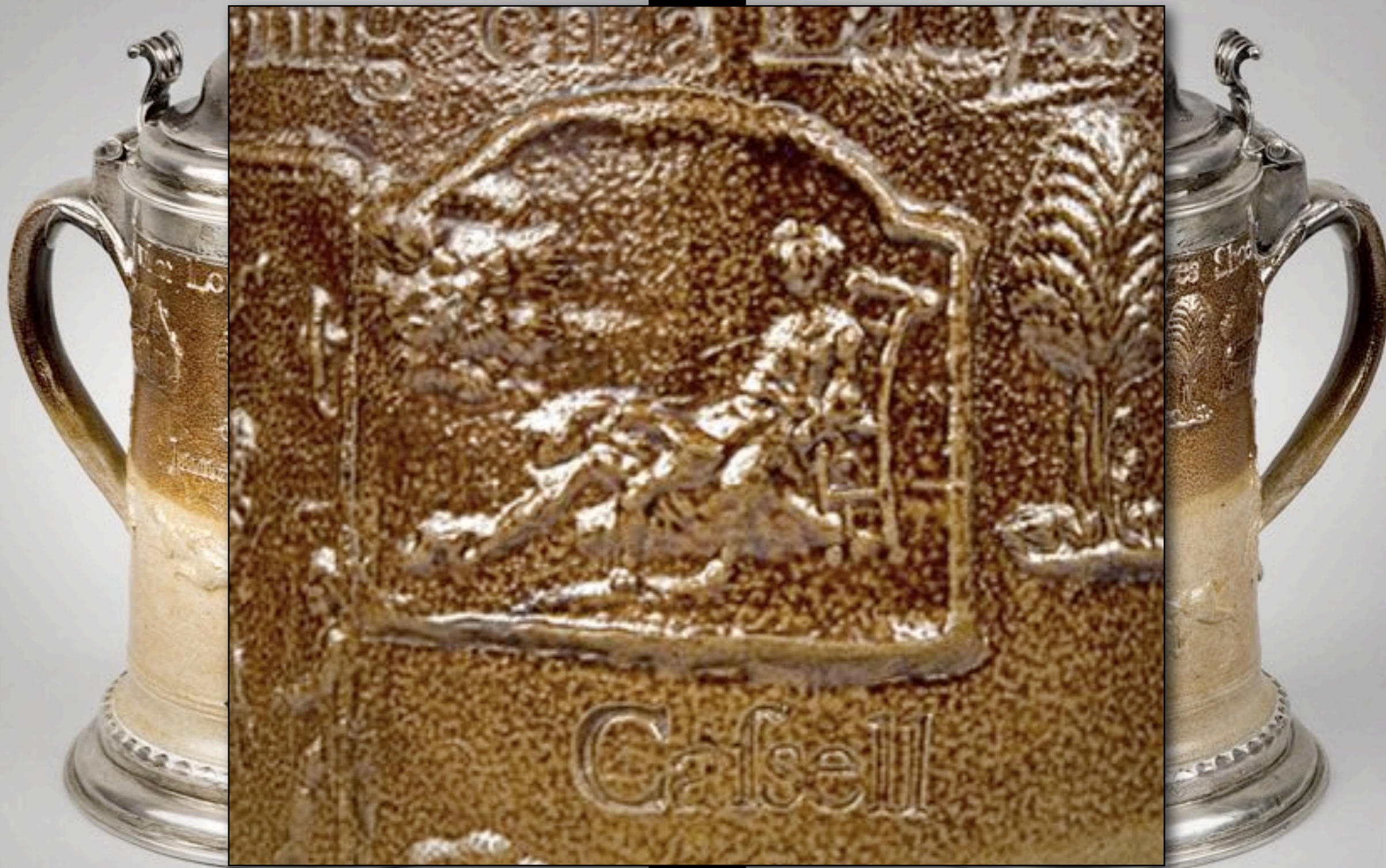
English Salt Glazed Brown Stoneware Tankard with Silver Mounts "See what Love & art can dew by Fiting on a Ladyes Shoe"