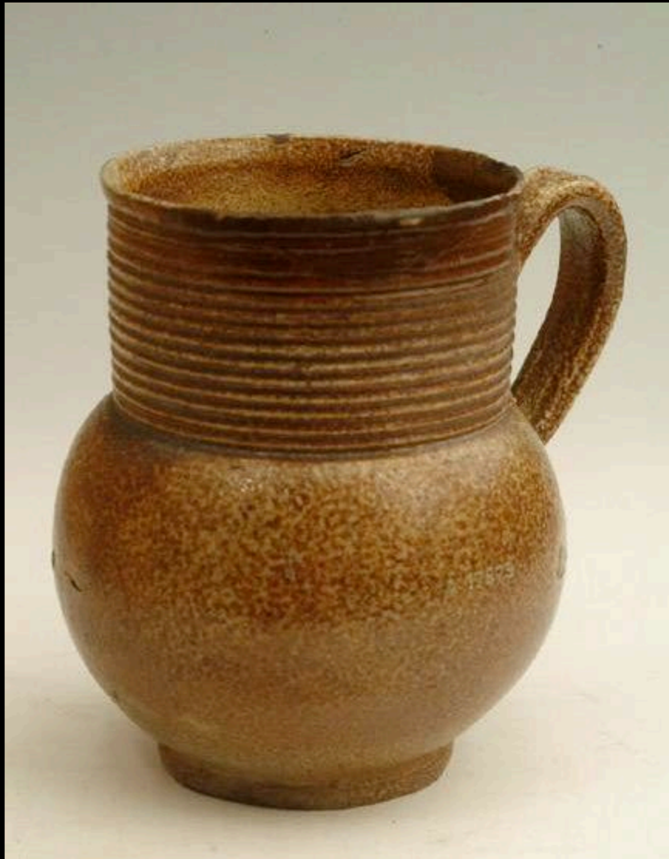
English Salt Glazed Stoneware "Gorge" Mug from Fulham / Hammersmith c. 1671 - 1703 (Museum of London)