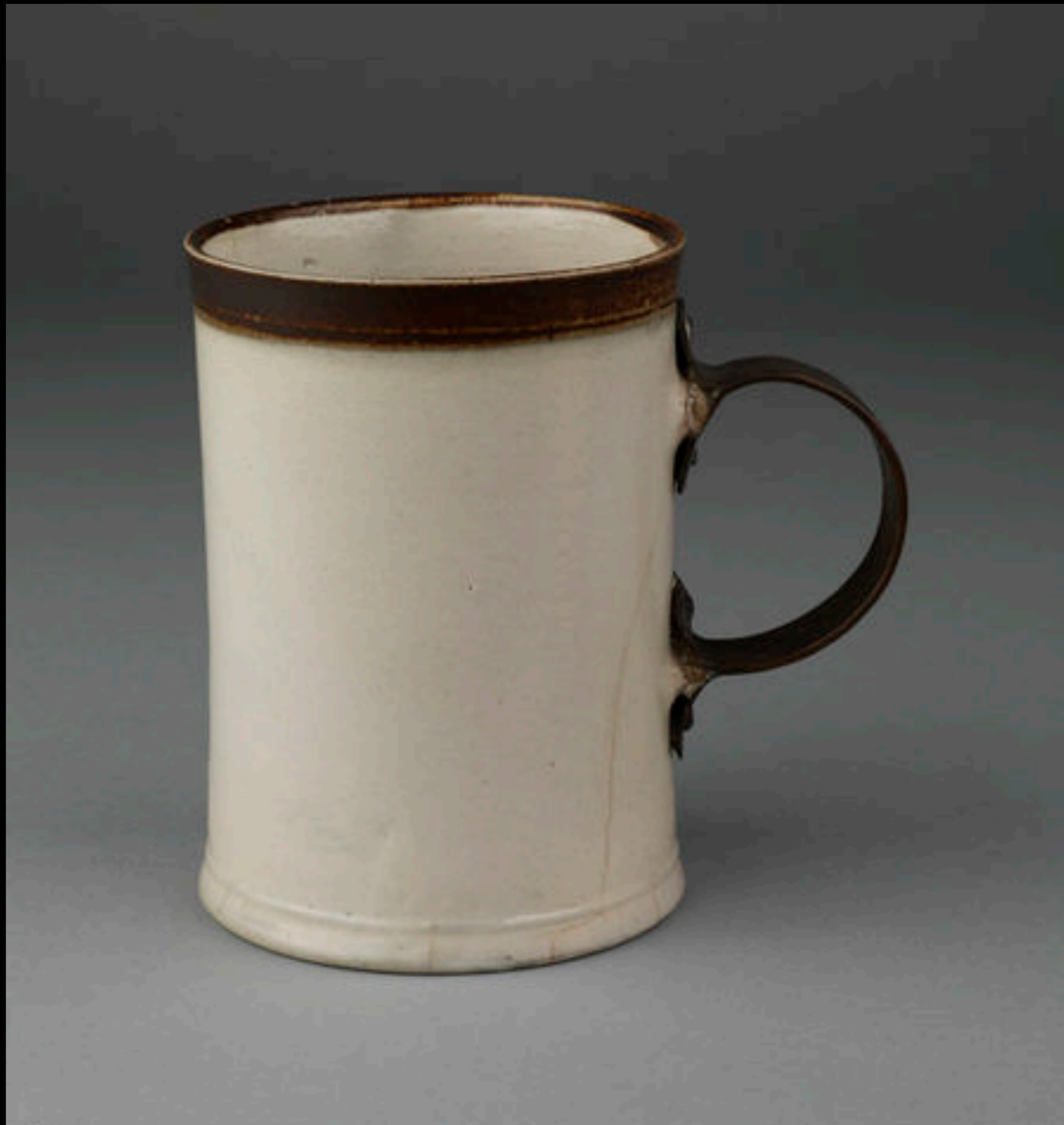
English Salt Glazed Mug from Staffordshire