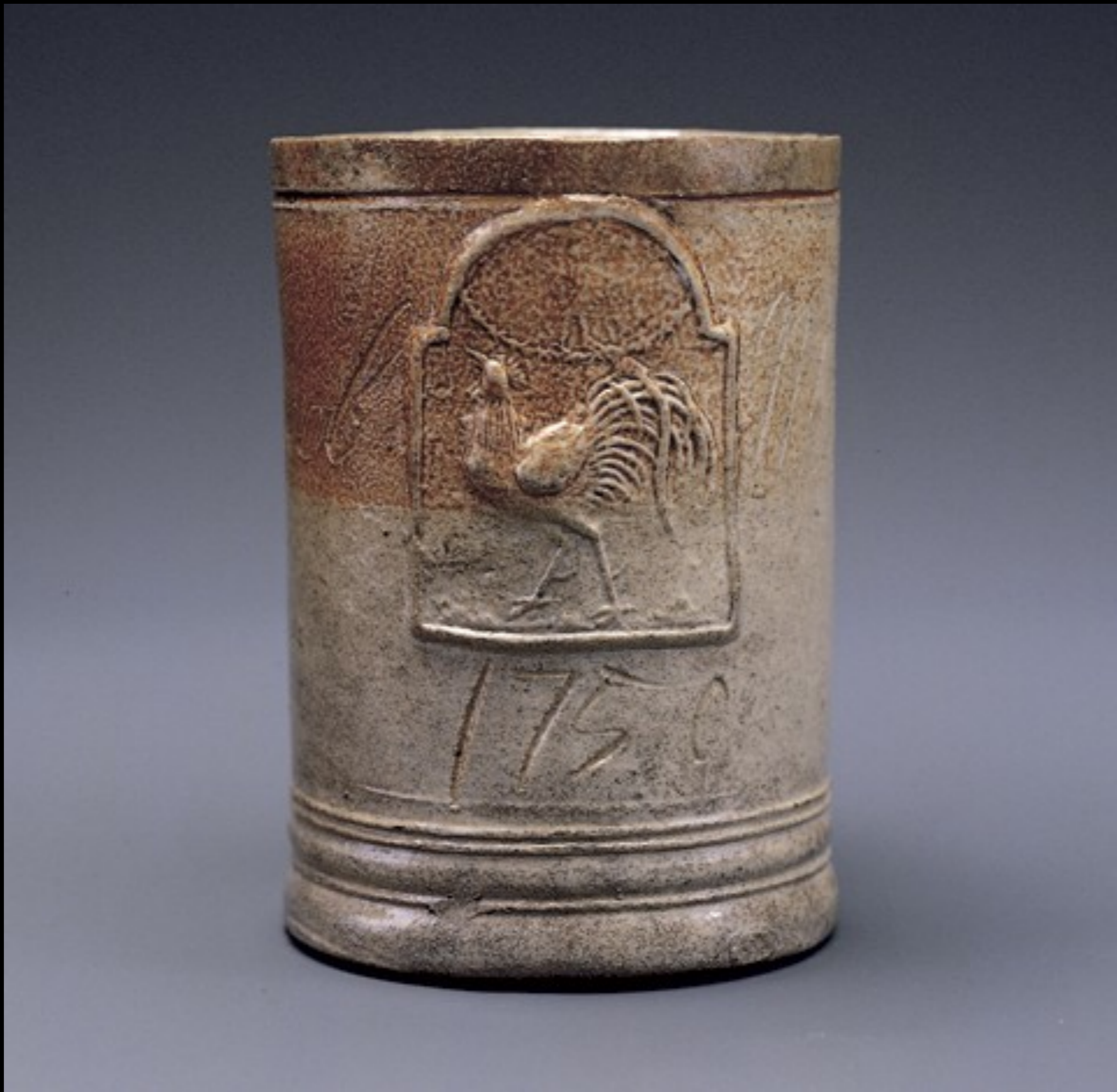
English Salt Glazed Stoneware Mug with Applied Tavern Sign from Fulham "Jacob Morden 1750" (Chipstone)