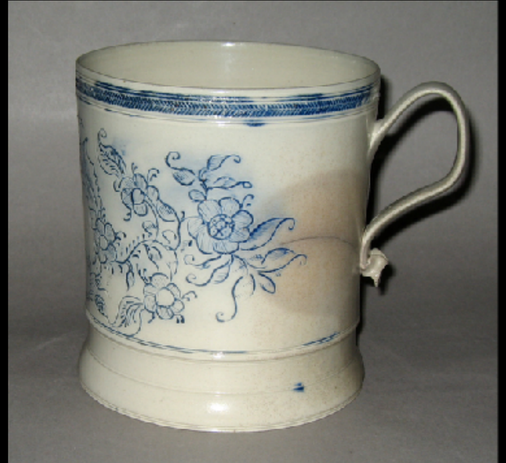
English Staffordshire Salt Glazed Scratch Blue Mug