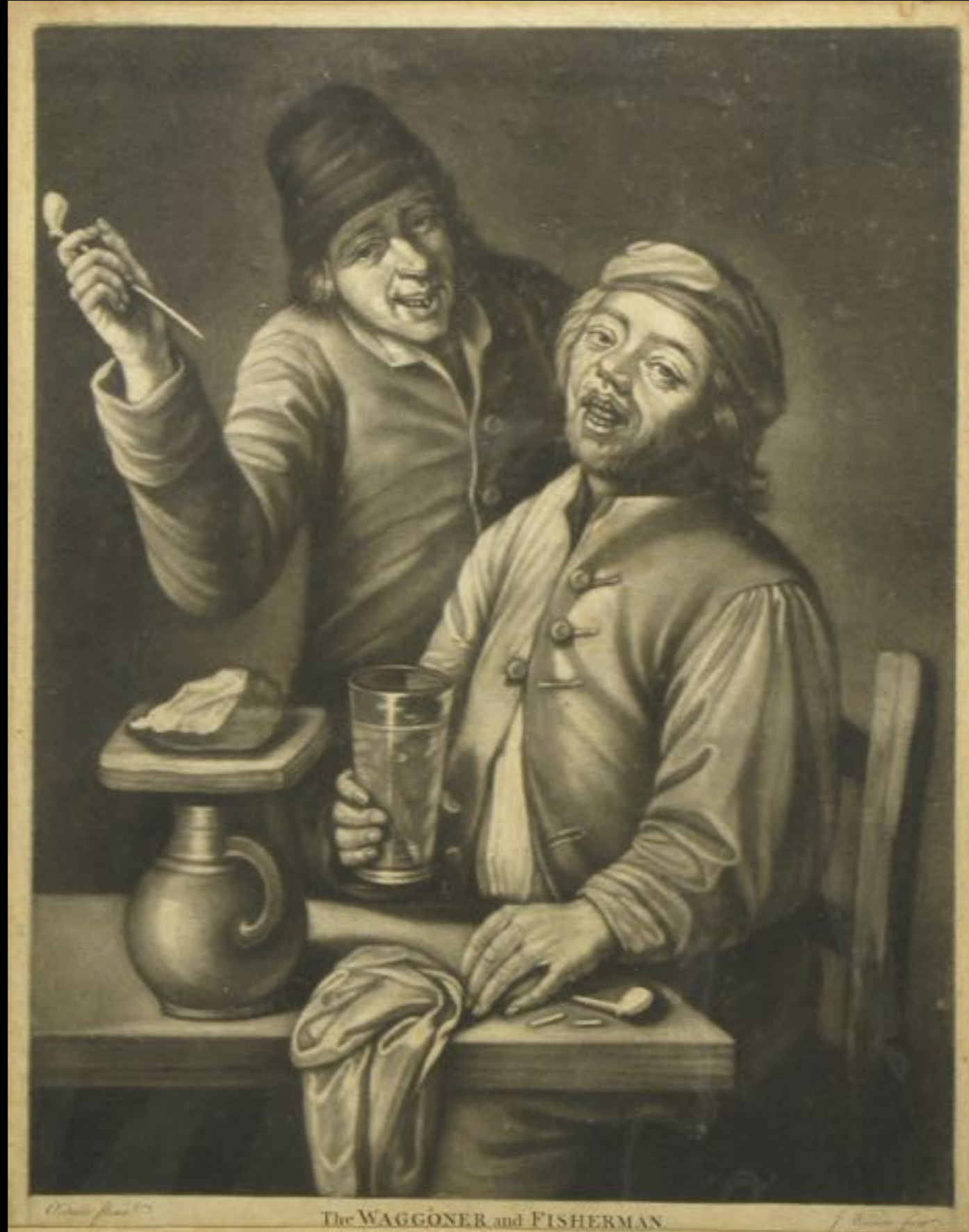
The WAGGONER and FISHERMAN