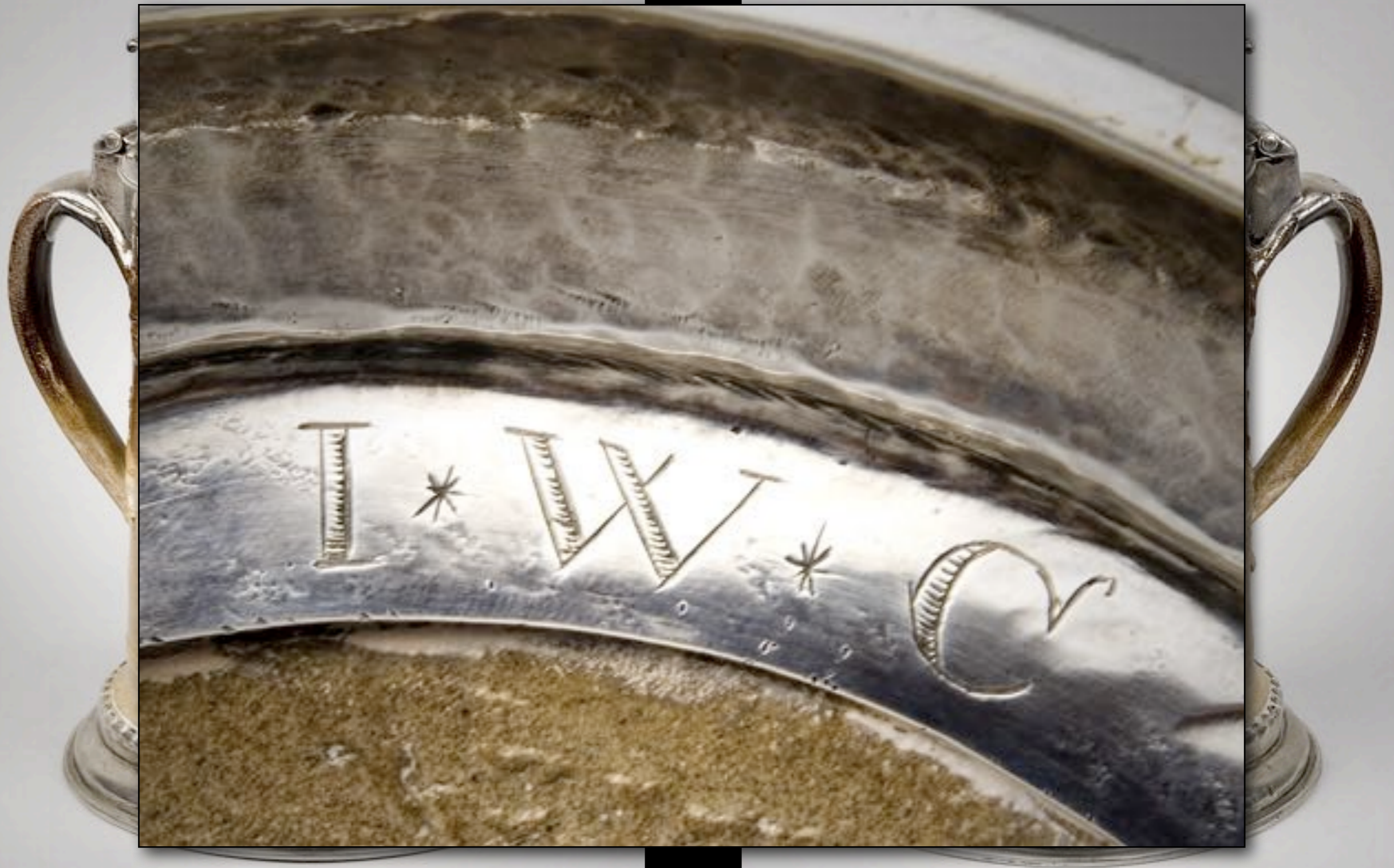
English Salt Glazed Brown Stoneware Tankard with Silver Mounts "See what Love & art can dew by Fiting on a Ladyes Shoe"