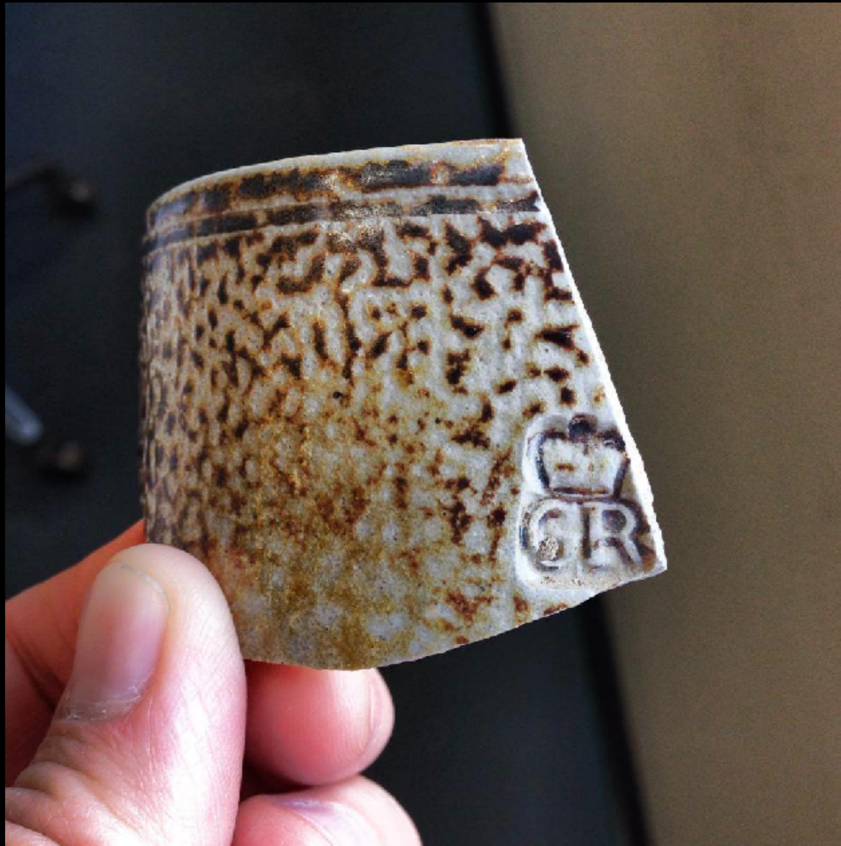
English Stoneware Tankard Shard with “GR” Excise Stamp of King George I, Probably from Bristol Recovered from the 3 Crown’s Tavern, Charlestown, Massachusetts (City of Boston Archeology Program)