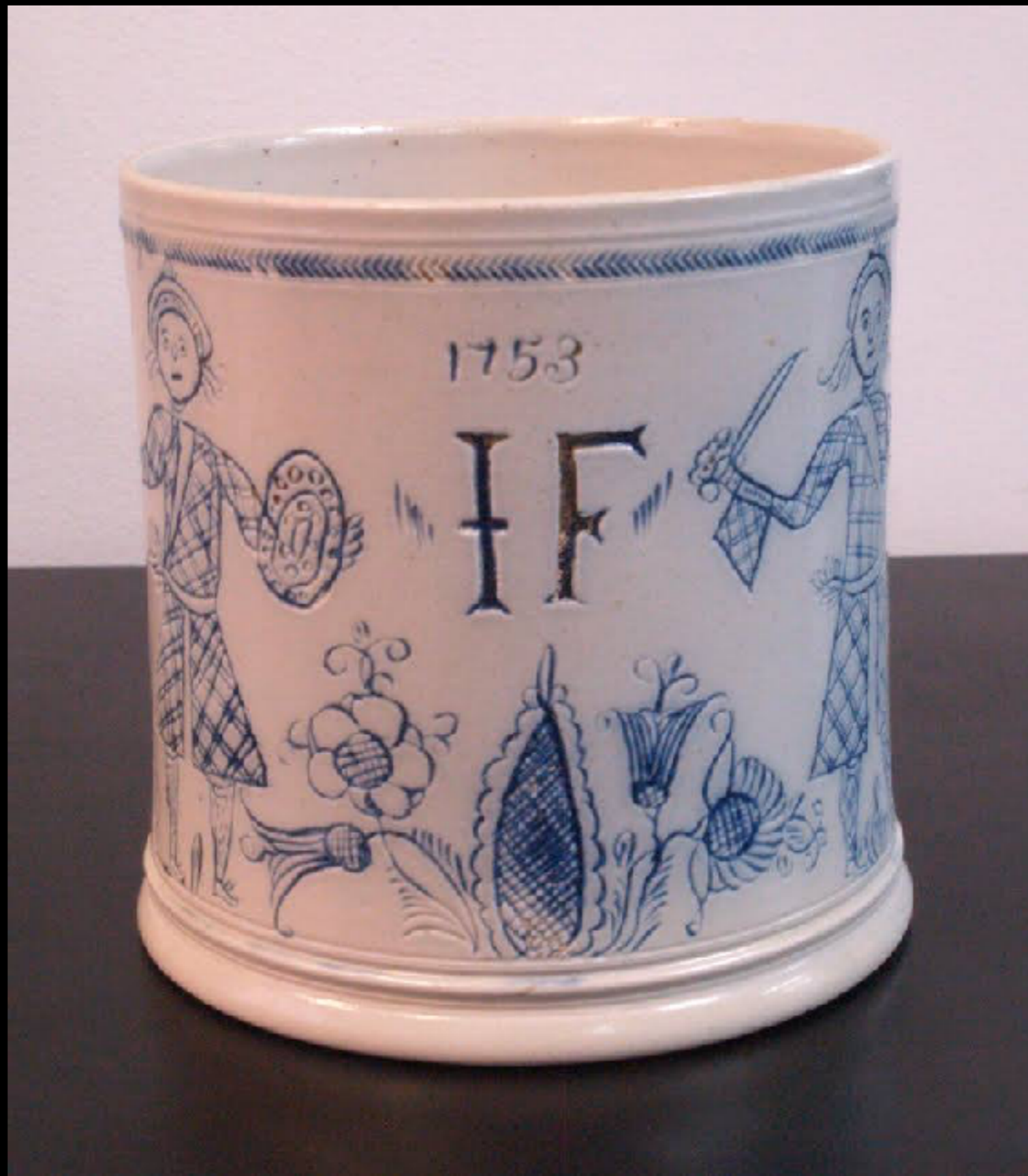
English Salt Glazed Scratch Blue Stoneware Mug from Bristol or Staffordshire