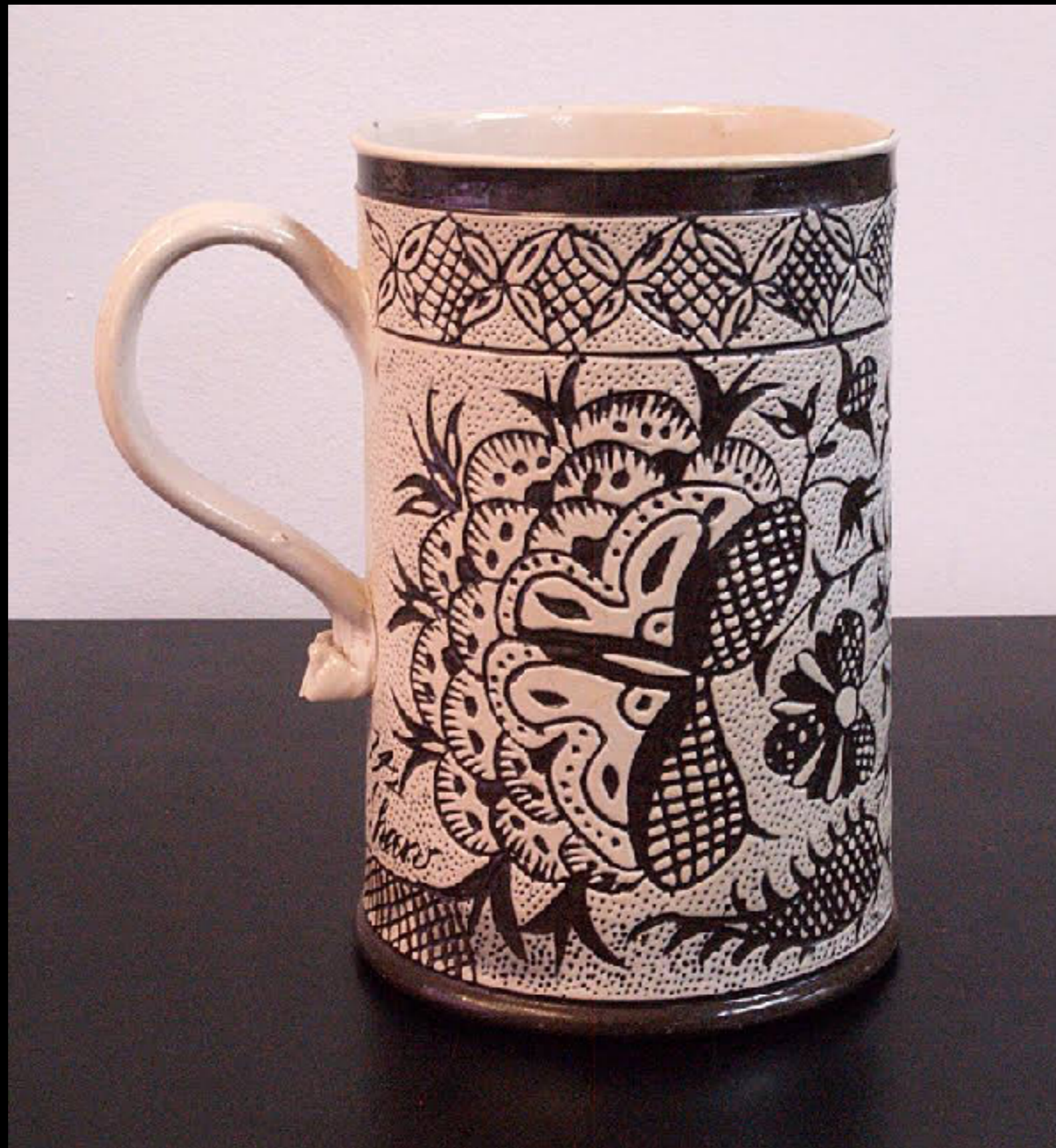
English Scratch Brown Salt Glazed Stoneware Mug