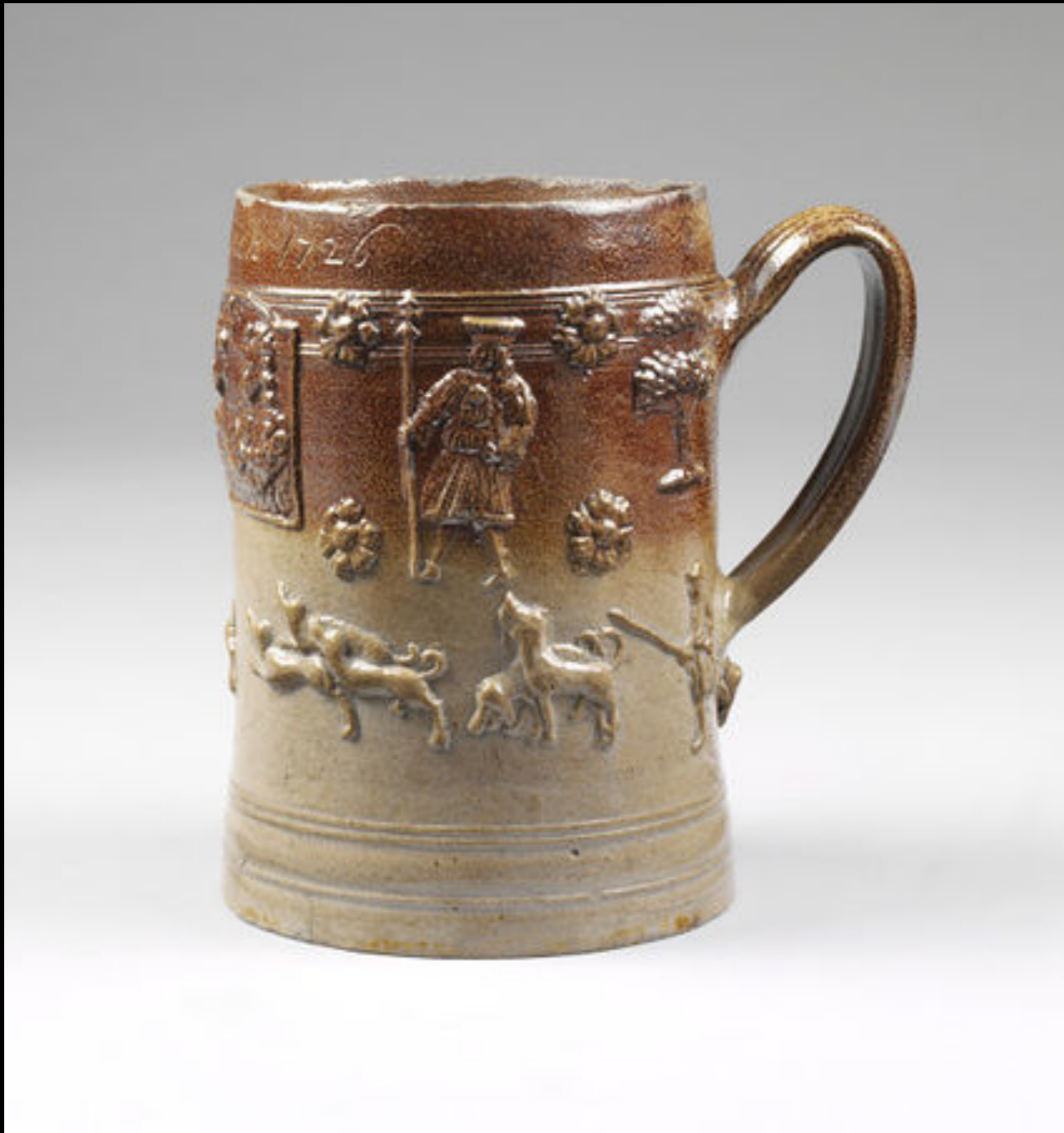
English Salt Glazed Stoneware Mug from Vauxhill