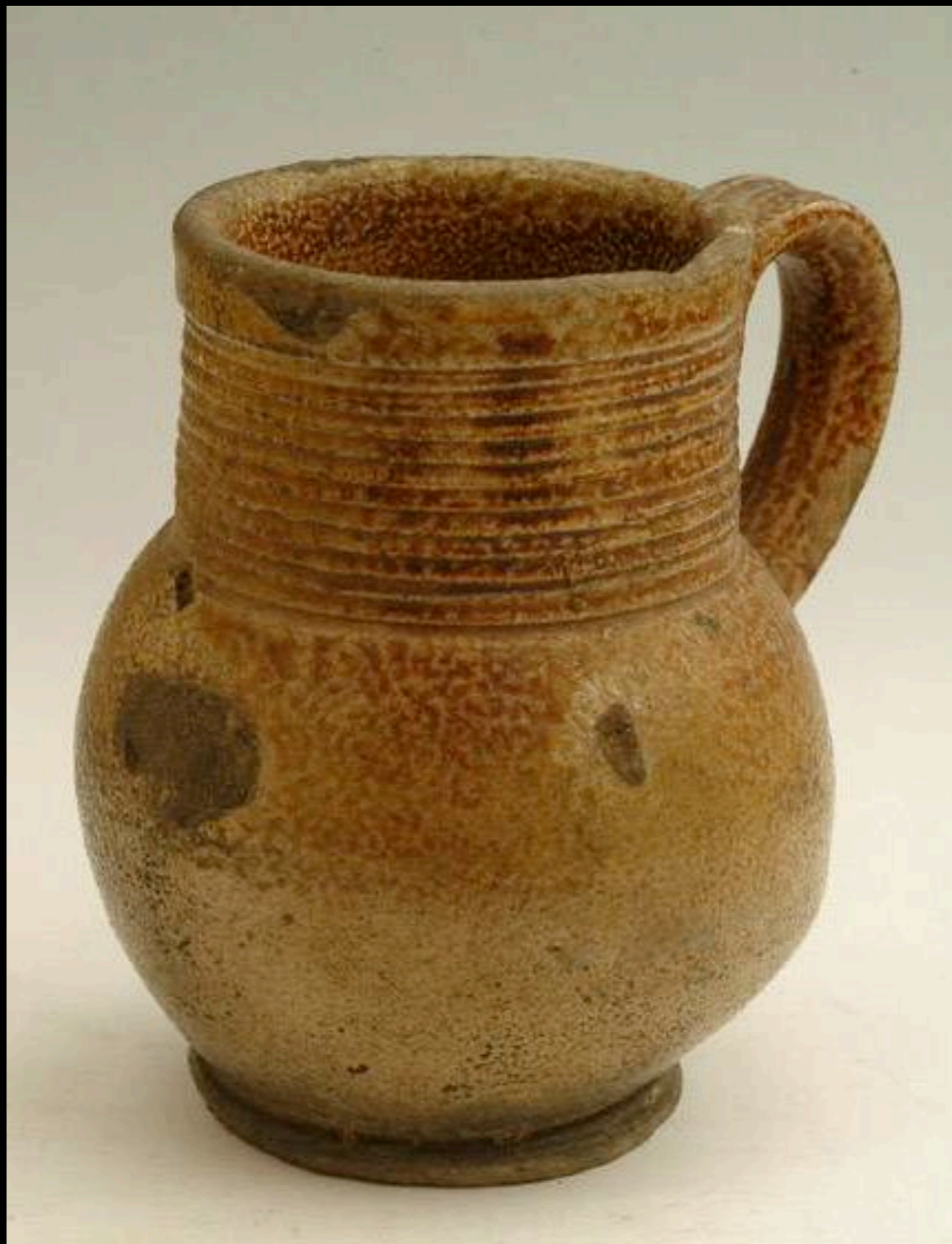
English Salt Glazed Stoneware "Gorge" Mug from Fulham / Hammersmith c. 1671 - 1703 (Museum of London)