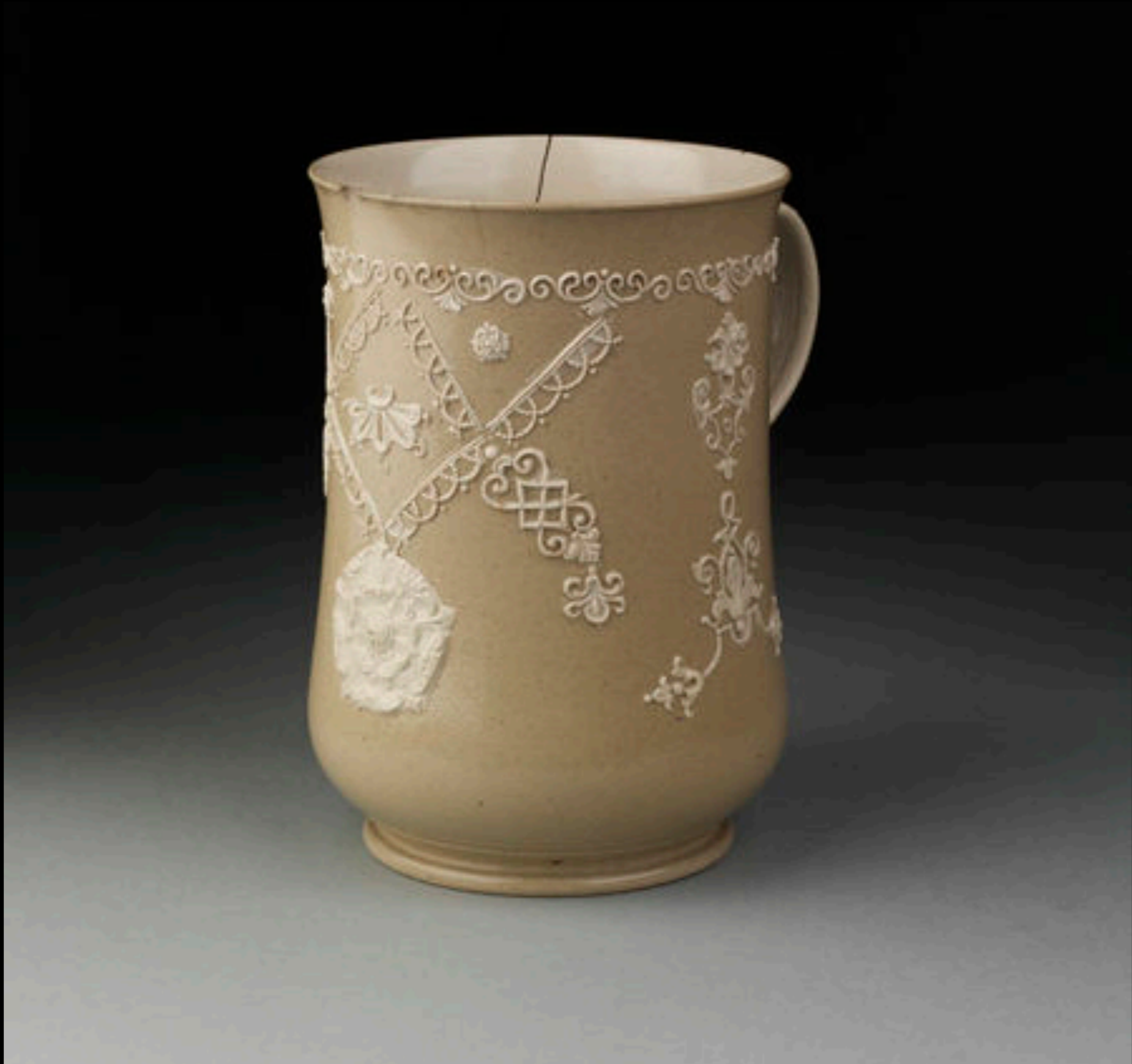
English Salt Glazed Mug with Mould - Applied Decorations from Staffordshire