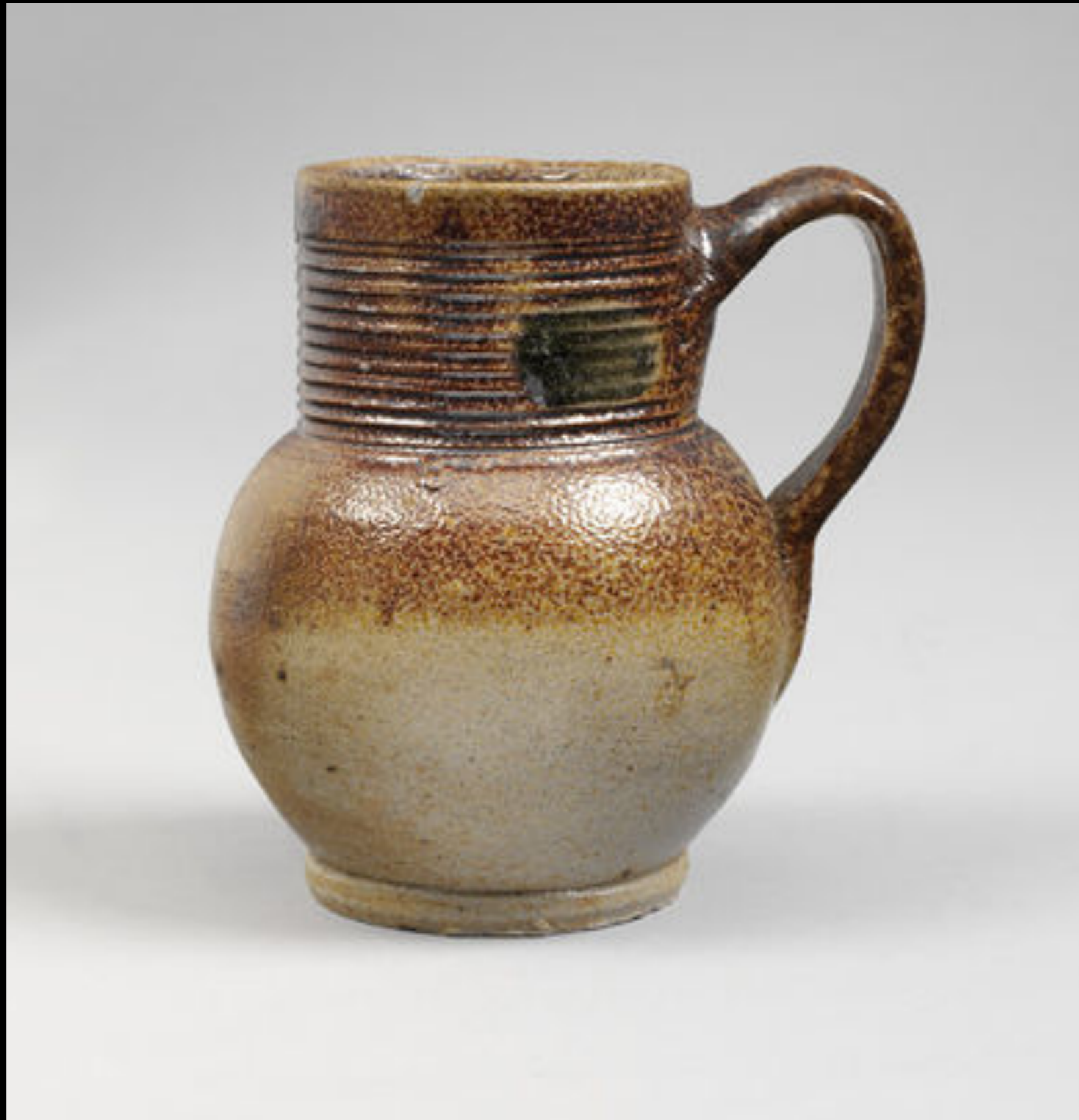
English Salt Glazed Stoneware "Gorge" Mug from London c. 1680 - 1700 (Victoria & Albert)