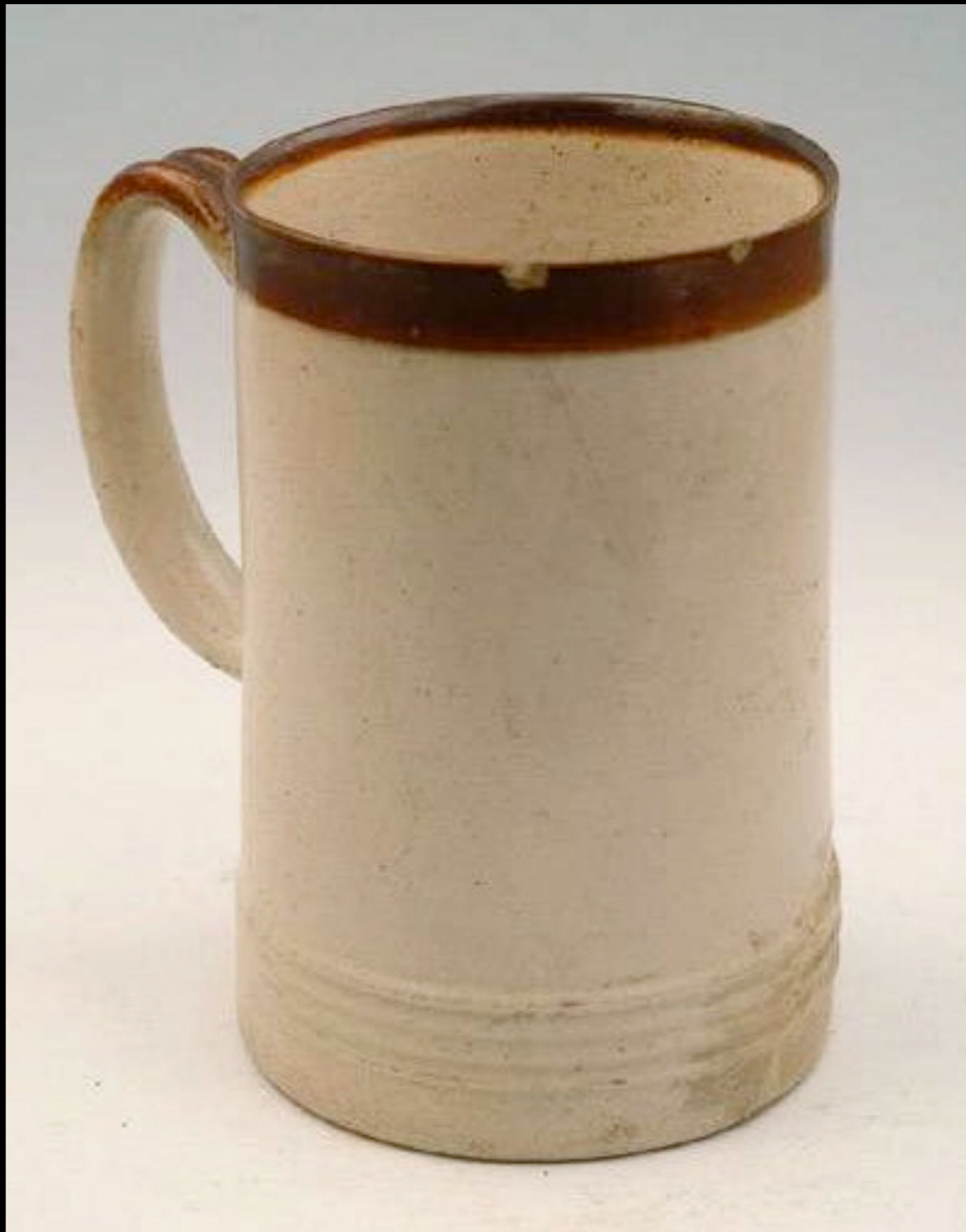
English Salt Glazed Stoneware Mug from Staffordshire c. 1691 - 1730 (Museum of London)