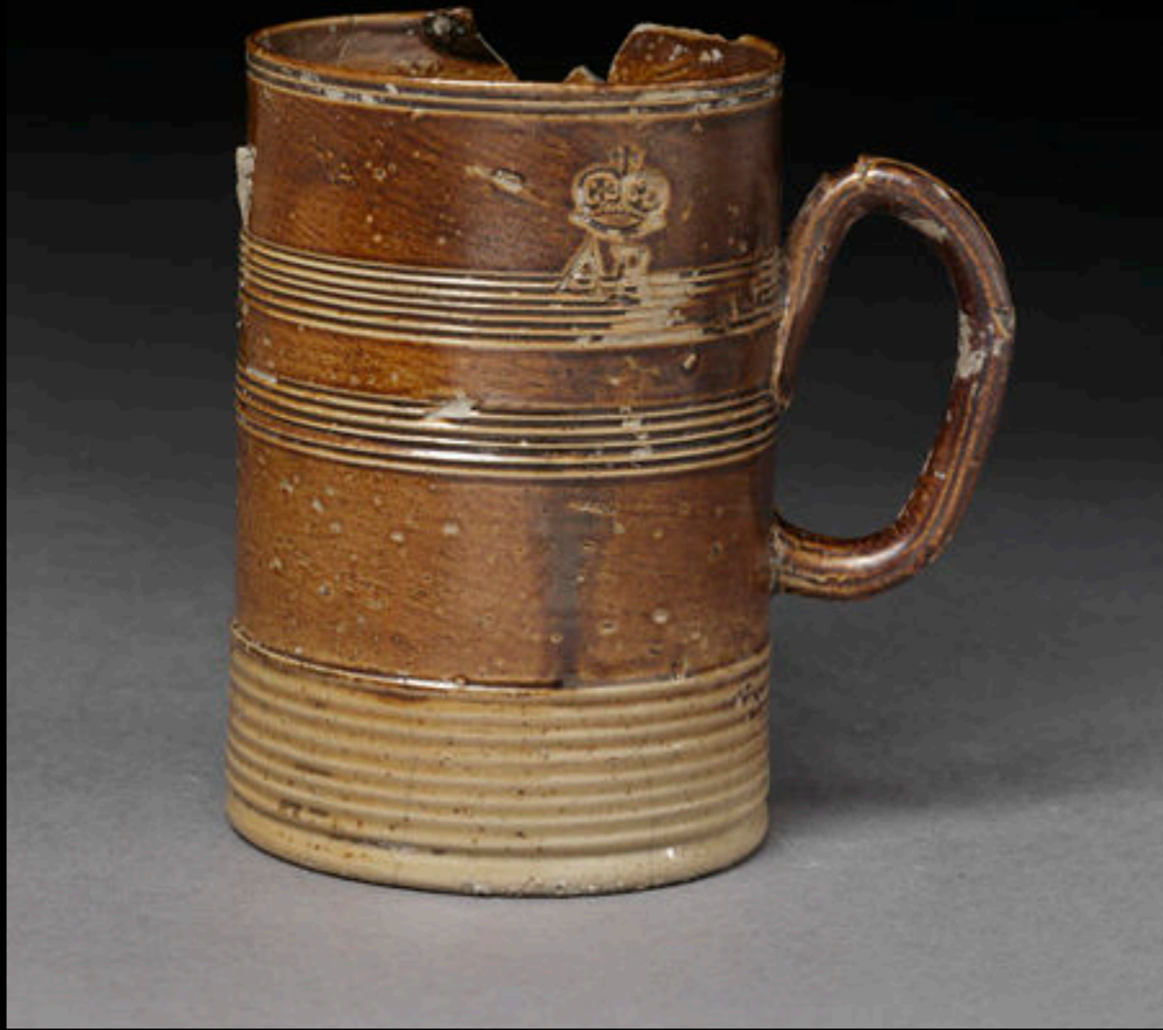
English Salt Glazed Stoneware Mug with an "AR" Excise Stamp (Queen Anne) from Burslem