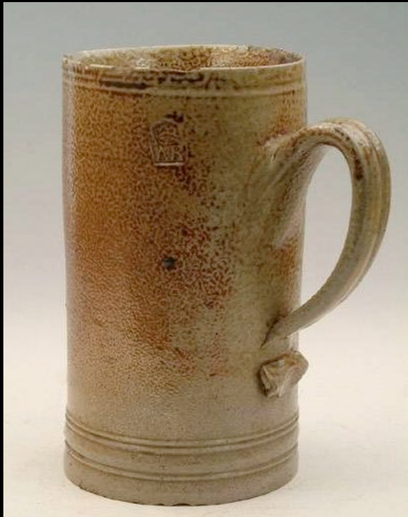
English Stoneware Tankard Stamped with an "AR" Excise Stamp (Queen Anne) from Fulham / Hammersmith