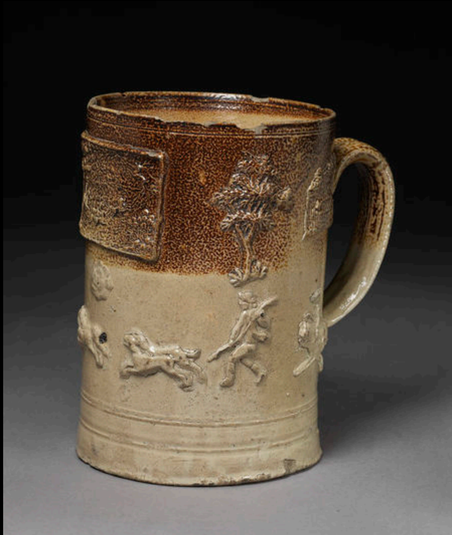
English Salt Glazed Stoneware Mug from London by "Factory C" c. 1730 (Victoria & Albert)