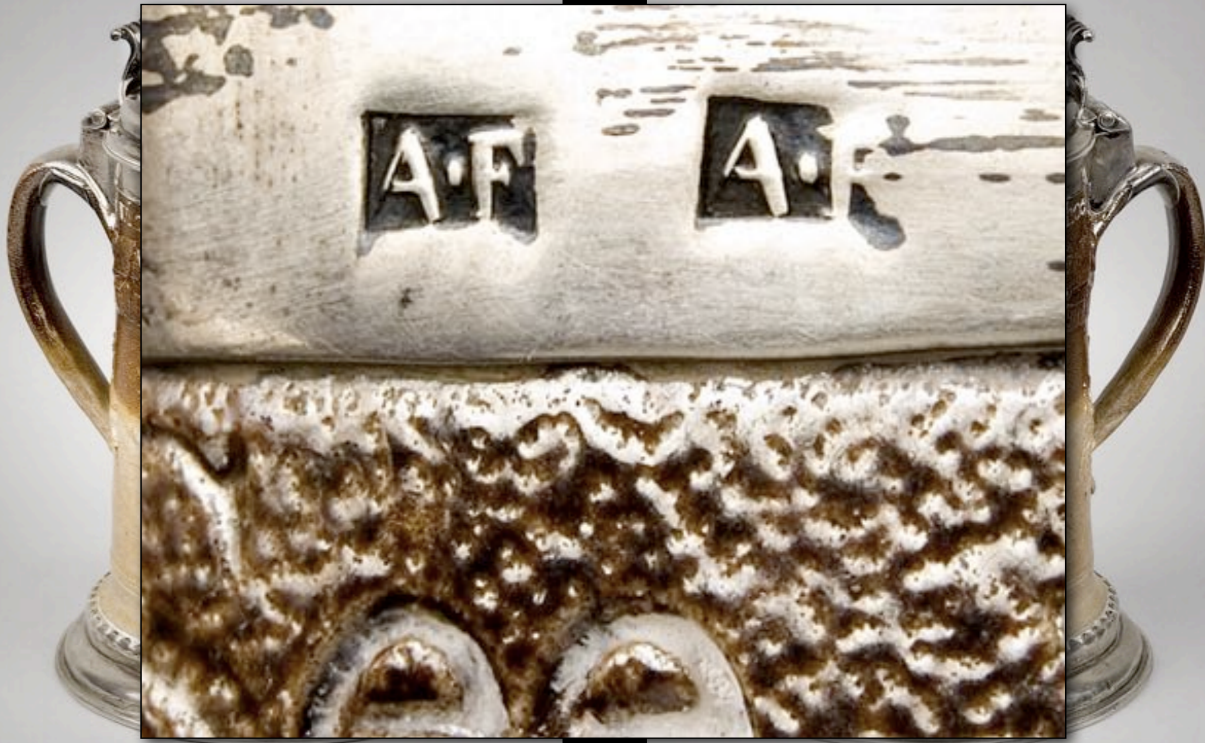
English Salt Glazed Brown Stoneware Tankard with Silver Mounts "See what Love & art can dew by Fiting on a Ladies Shoe"