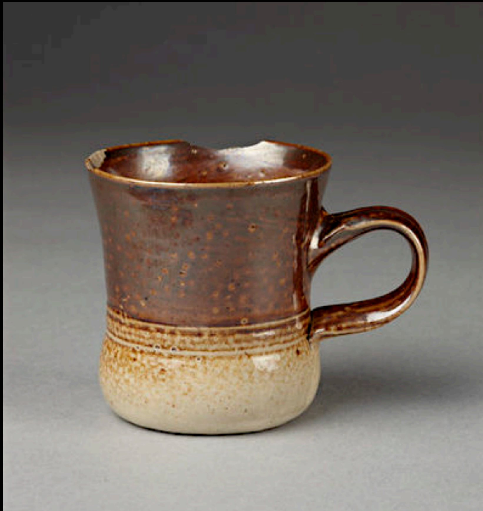
English Salt Glazed Stoneware Cup from Staffordshire