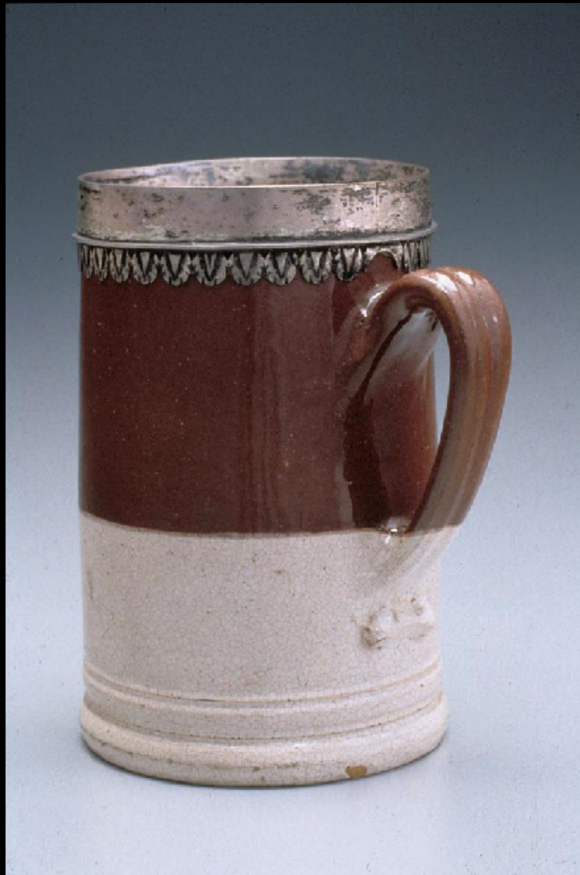
English Two Quart Double Slip Lead Glazed Stoneware Mug