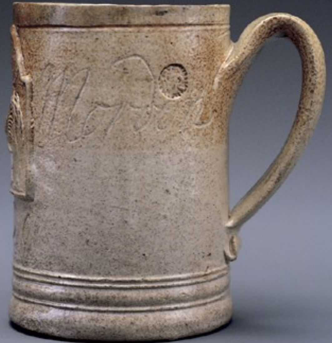
English Salt Glazed Stoneware Mug with Applied Tavern Sign from Fulham "Jacob Morden 1750" (Chipstone)