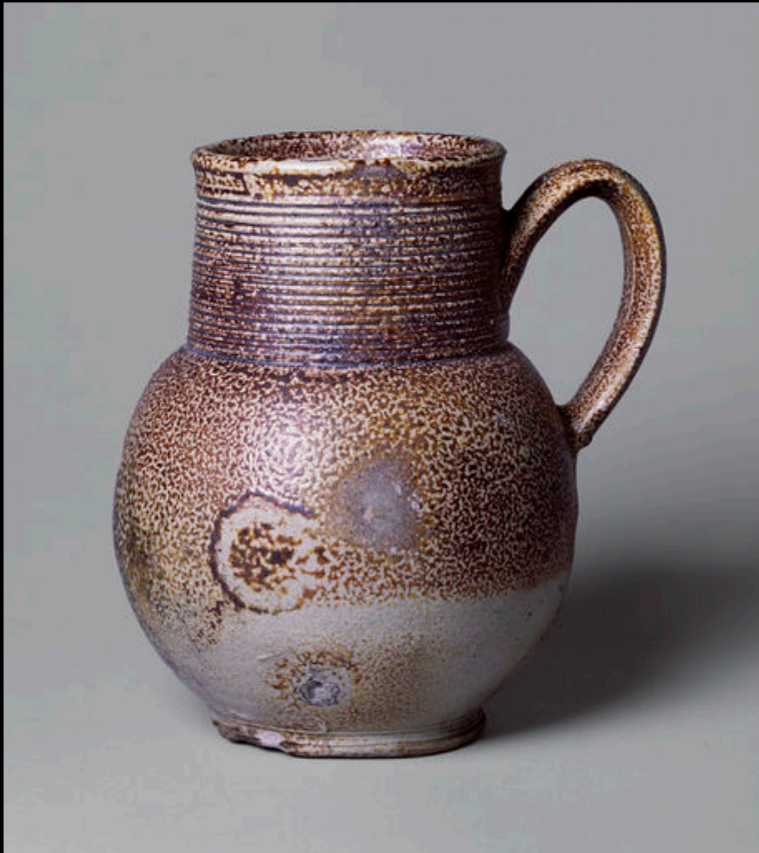
English Salt Glazed Stoneware "Gorge" Mug from Southwark c. 1680 - 1700 (Victoria & Albert)