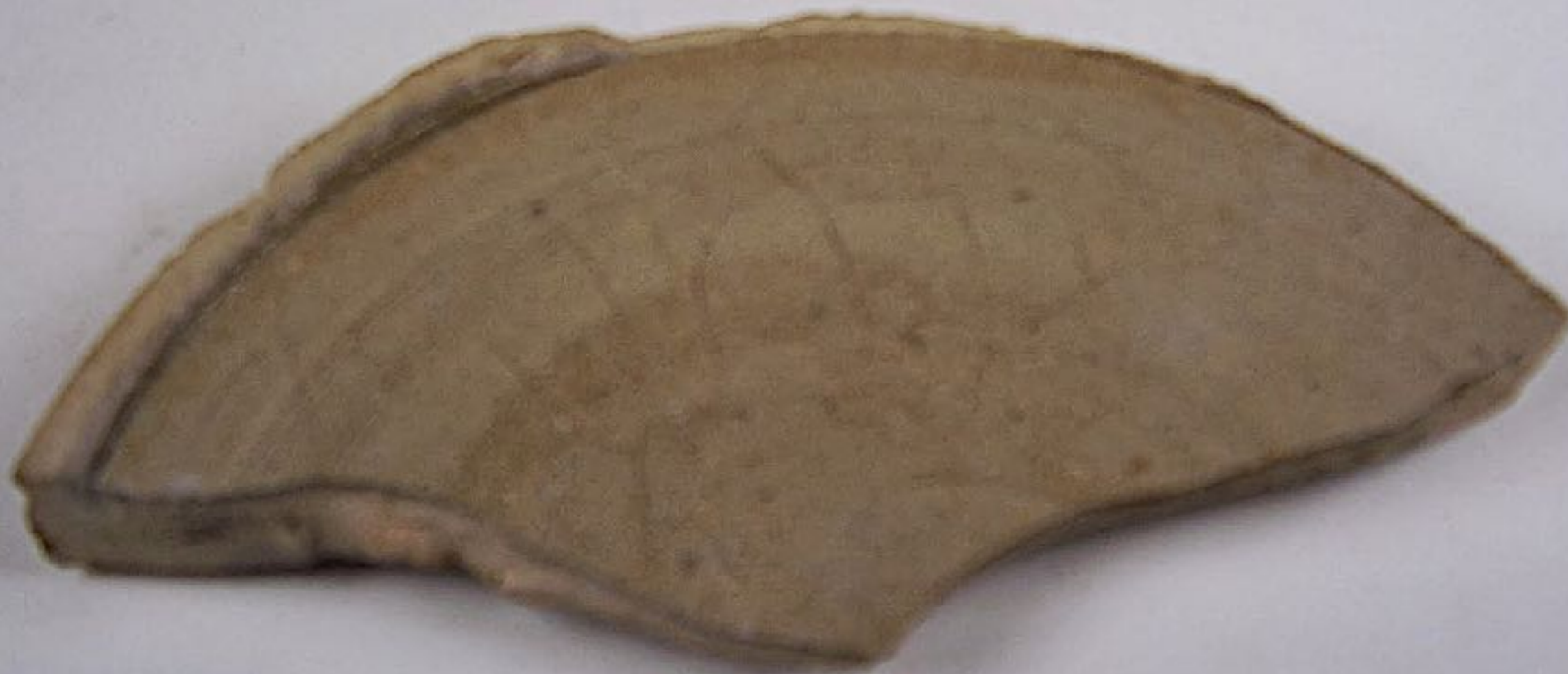
Possibly Foreign Made or American Made Salt Glazed Stoneware Mug Shard from Massachusetts Recovered from Faneuil Hall in Boston, Massachusetts Found in a Context with a Mean Date of 1723