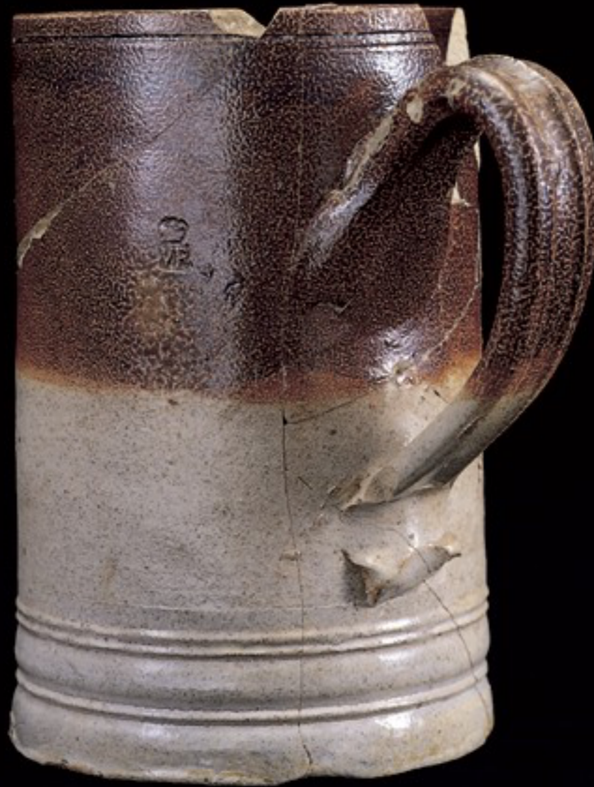
English Salt Glazed Stoneware Mug Likely from London Excavated at the Edward Rumney / Stephen West Tavern, London Town, Maryland c. 1725