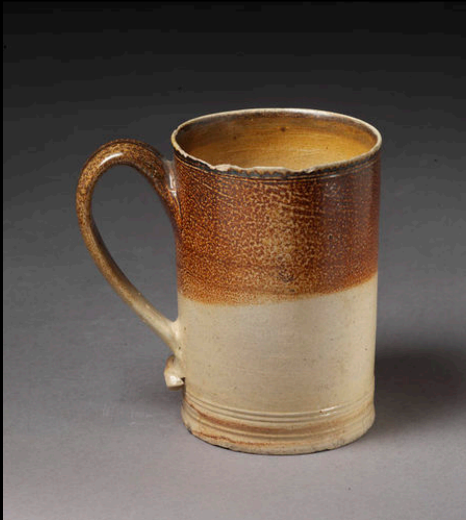
English Salt Glazed Stoneware Mug with an "GR" Excise Stamp King George I or II) from Bristol