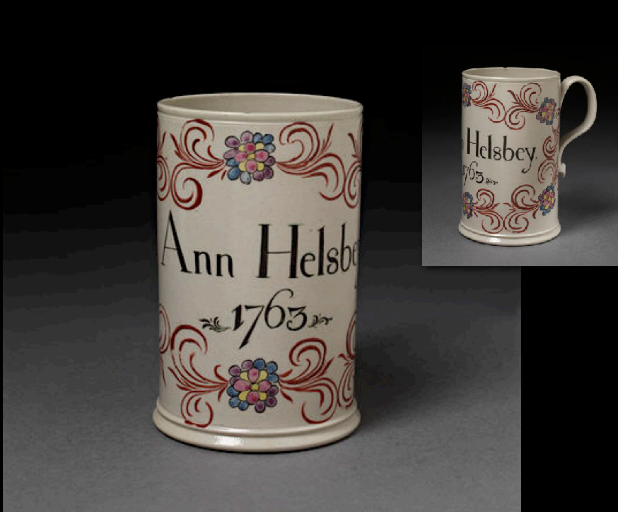
English Salt Glazed Stoneware Mug with Enameled Colors from Staffordshire 1763 (Victoria & Albert)