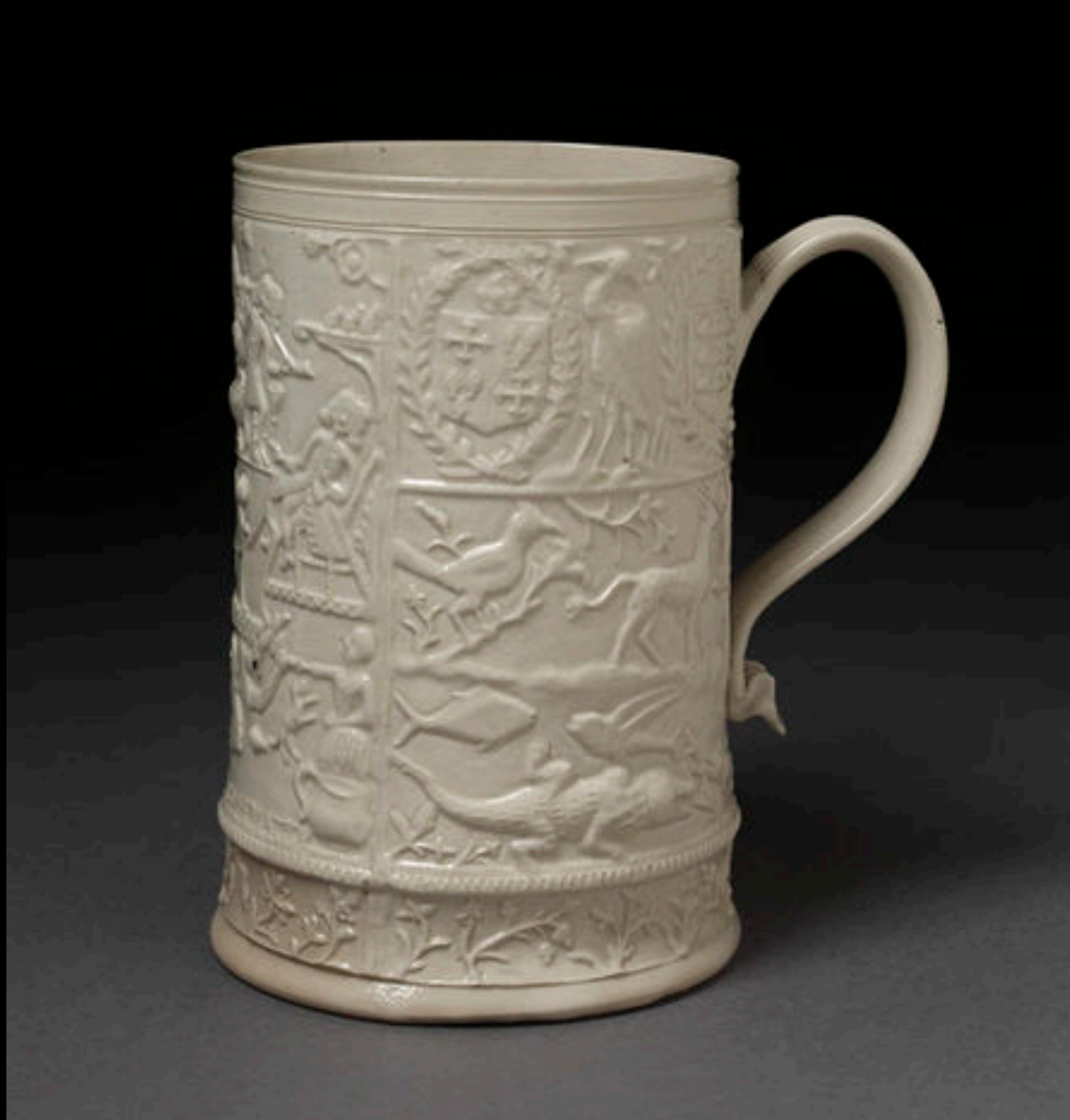
English Salt Glazed Mug from Staffordshire