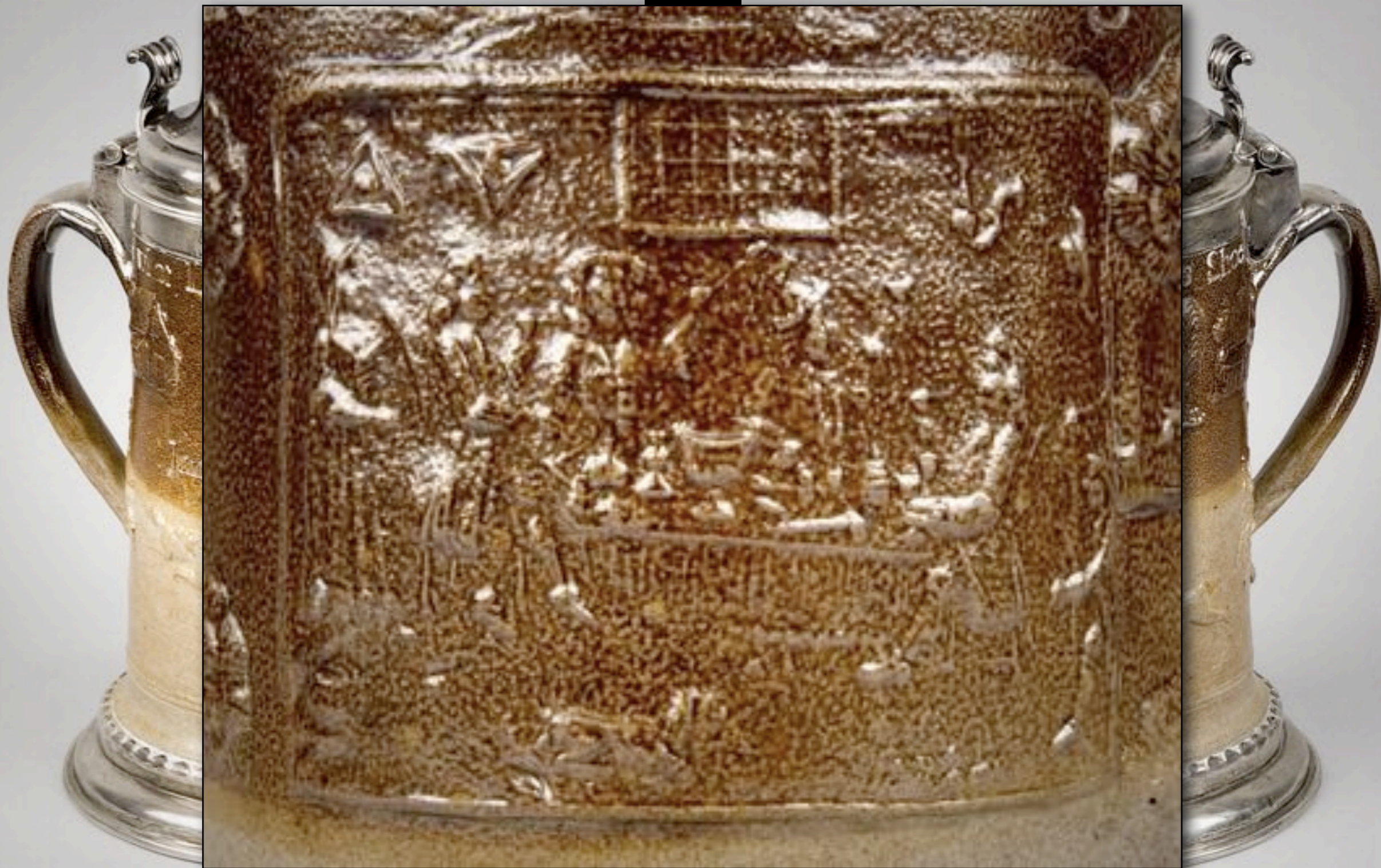
English Salt Glazed Brown Stoneware Tankard with Silver Mounts "See what Love & art can dew by Fiting on a Ladyes Shoe"