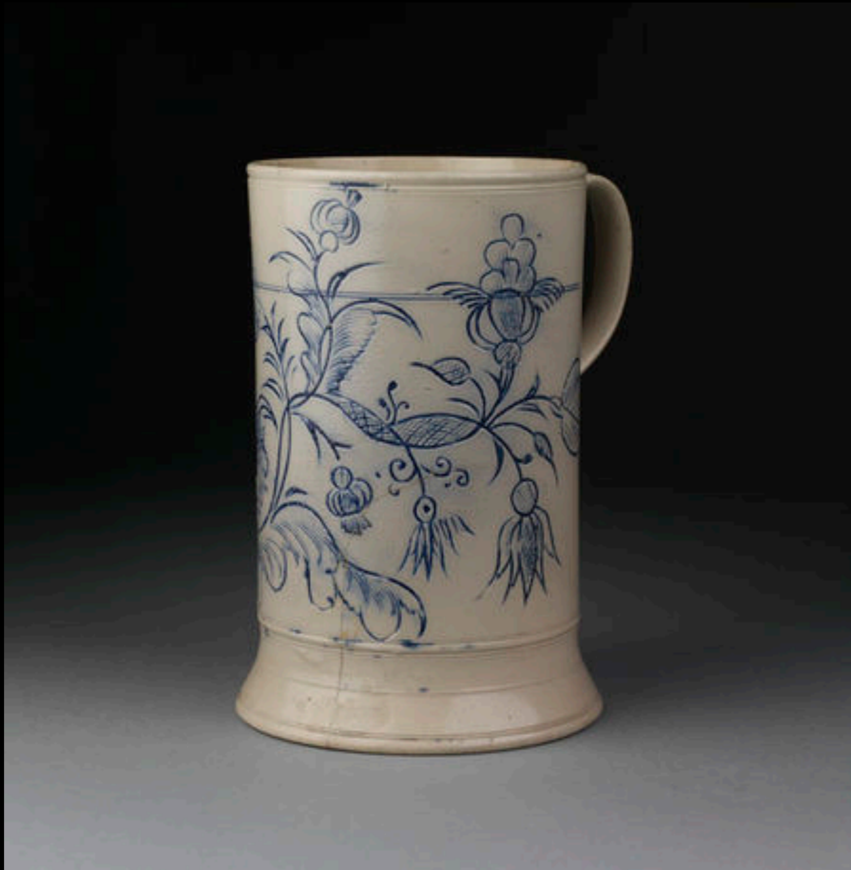
English Salt Glazed Scratch Blue Stoneware Mug from Bristol or Staffordshire