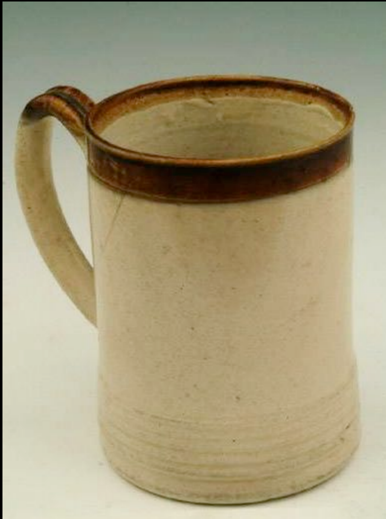
English Stoneware Salt Glazed Tankard from Fulham / Hammersmith c. 1691 - 1710 (Museum of London)