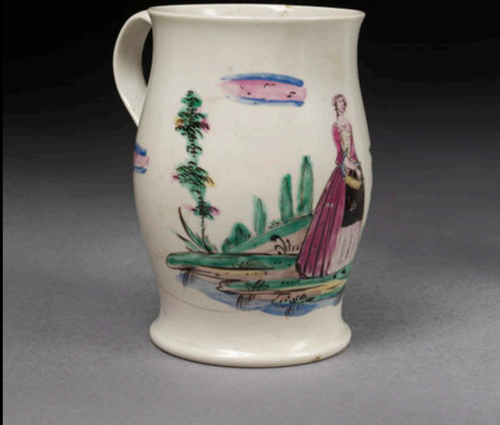
English Salt Glazed Stoneware Mug from Staffordshire or Yorkshire c. 1760 - 1770 (Victoria & Albert)