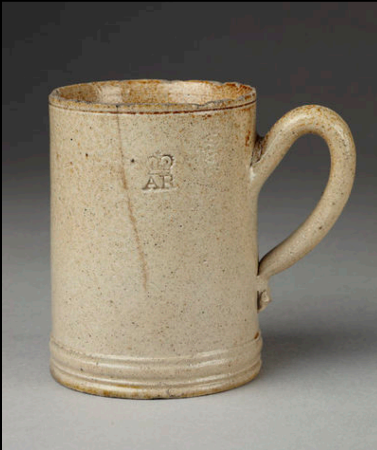
English Salt Glazed Stoneware Mug with "AR" Excise Mark (Queen Anne) from Southwark or Lambeth