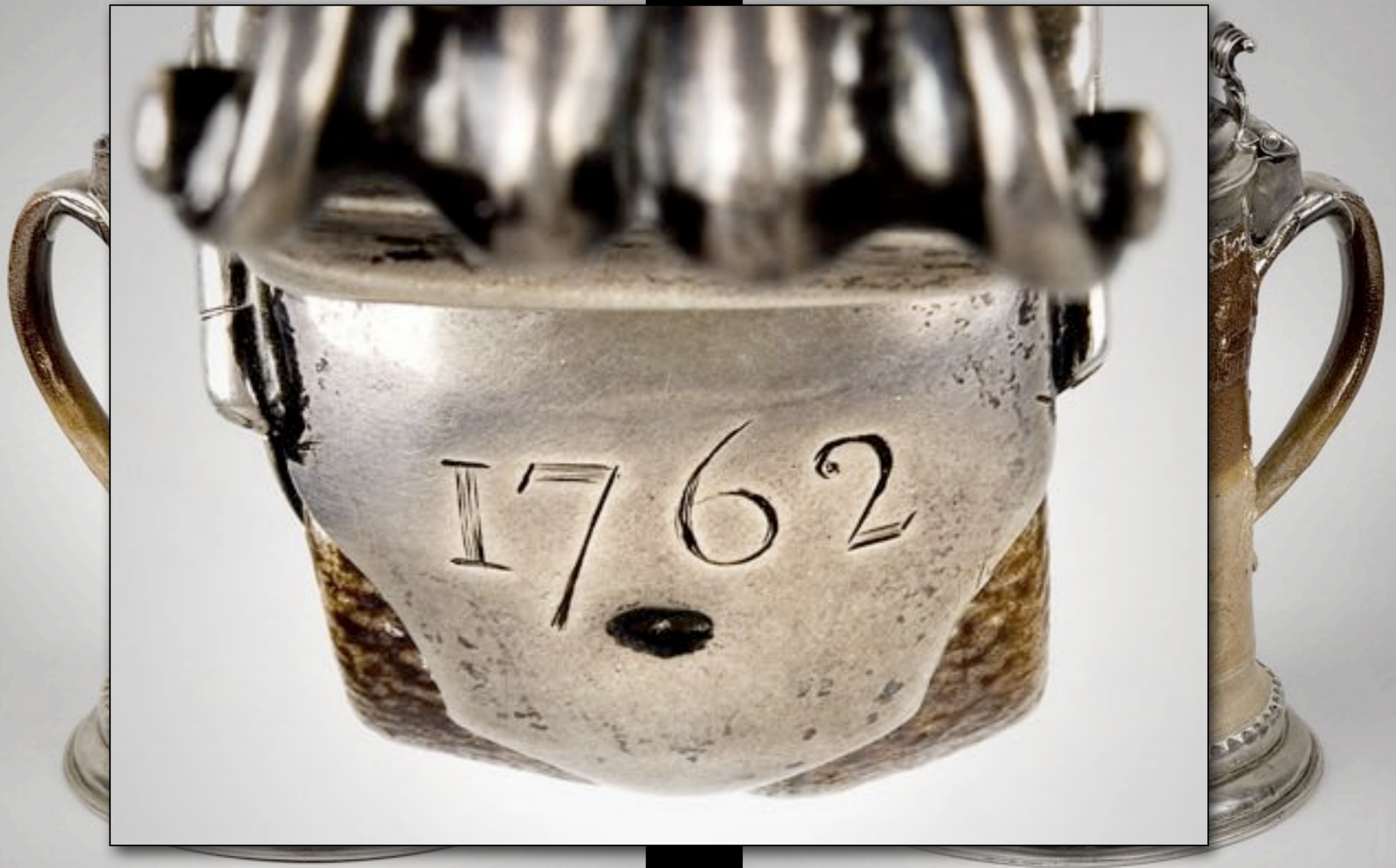
English Salt Glazed Brown Stoneware Tankard with Silver Mounts "See what Love & art can dew by Fiting on a Ladyes Shoe"