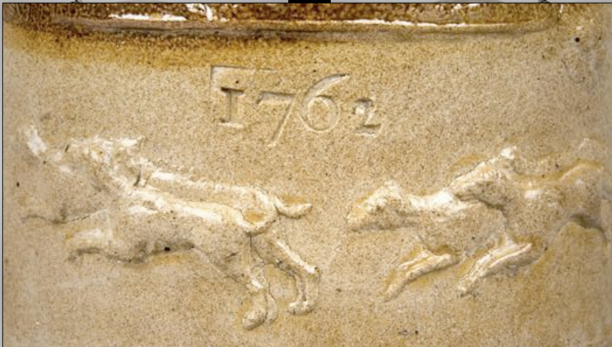
English Salt Glazed Brown Stoneware Tankard with Silver Mounts "See what Love & art can dew by Fiting on a Ladyes Shoe"