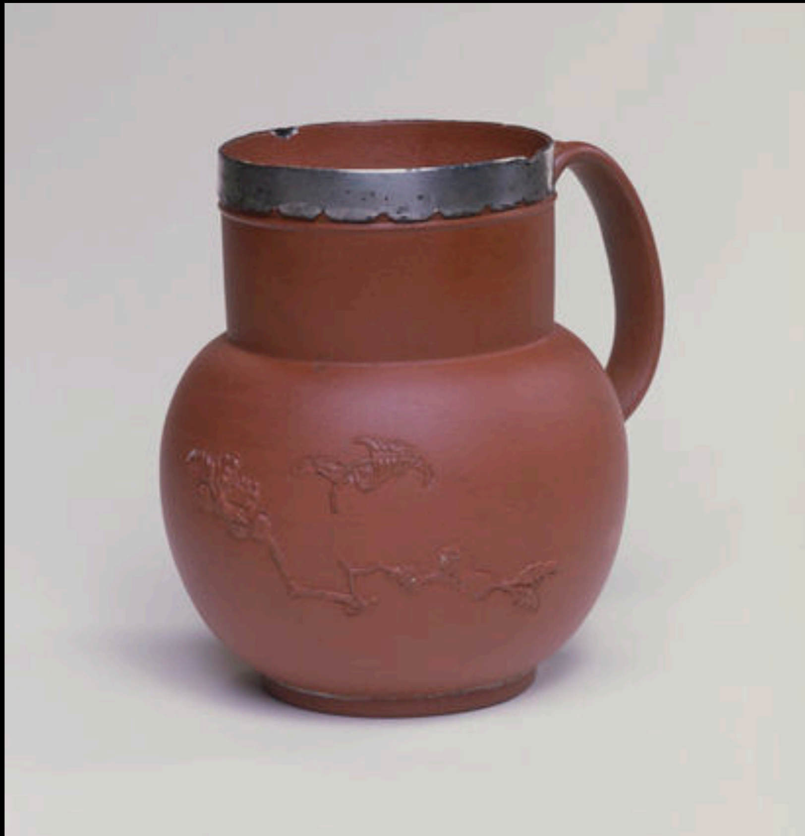
English Slip - Cast and Lathe - Turned Red Stoneware "Gorge" Mug with Applied Silver lip from Bradell Wood c. 1695 (Victoria & Albert)