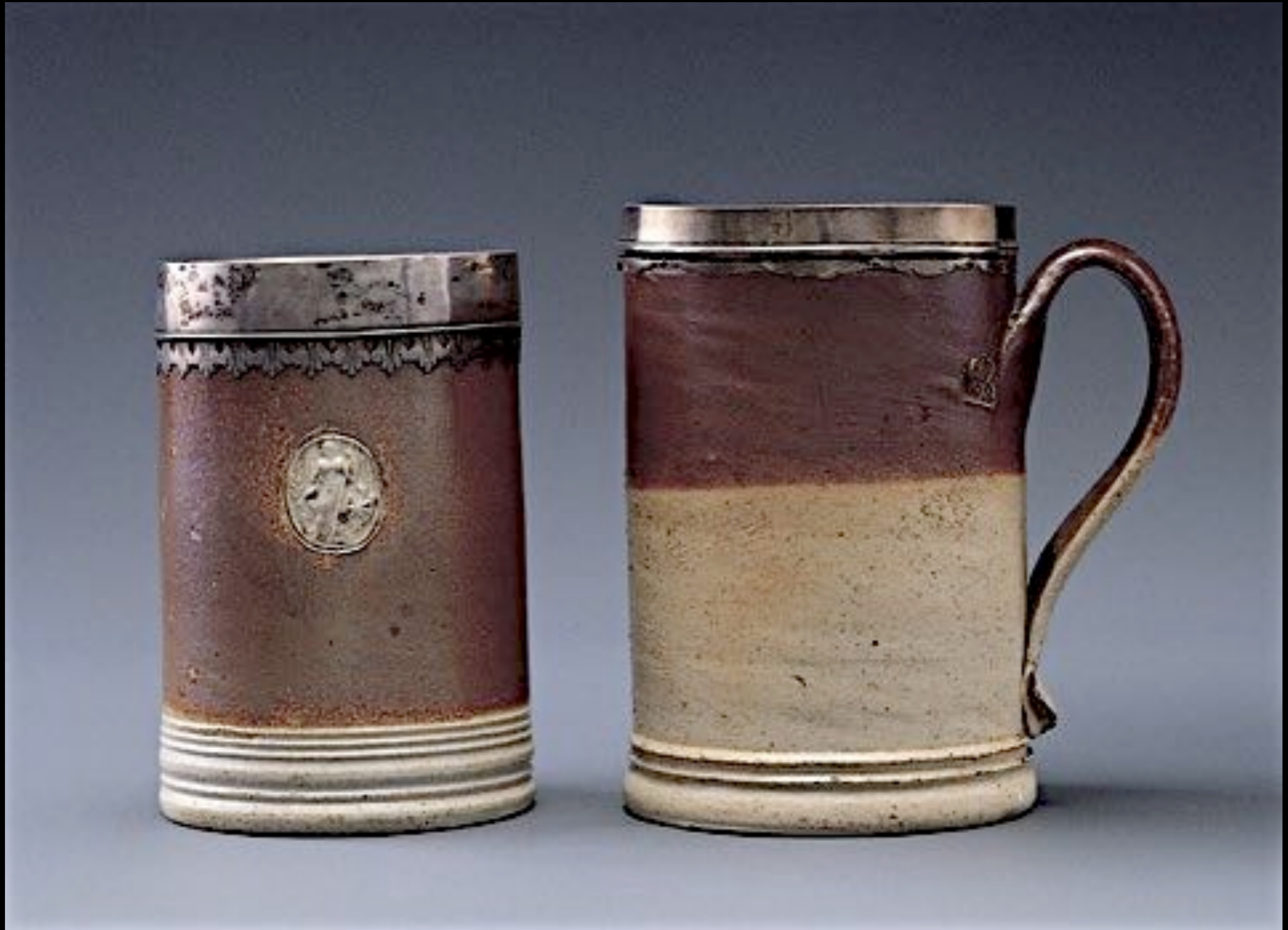
English Salt Glazed Stoneware Mugs from Fulham by John Dwight of Fulham c. 1700 - 1720