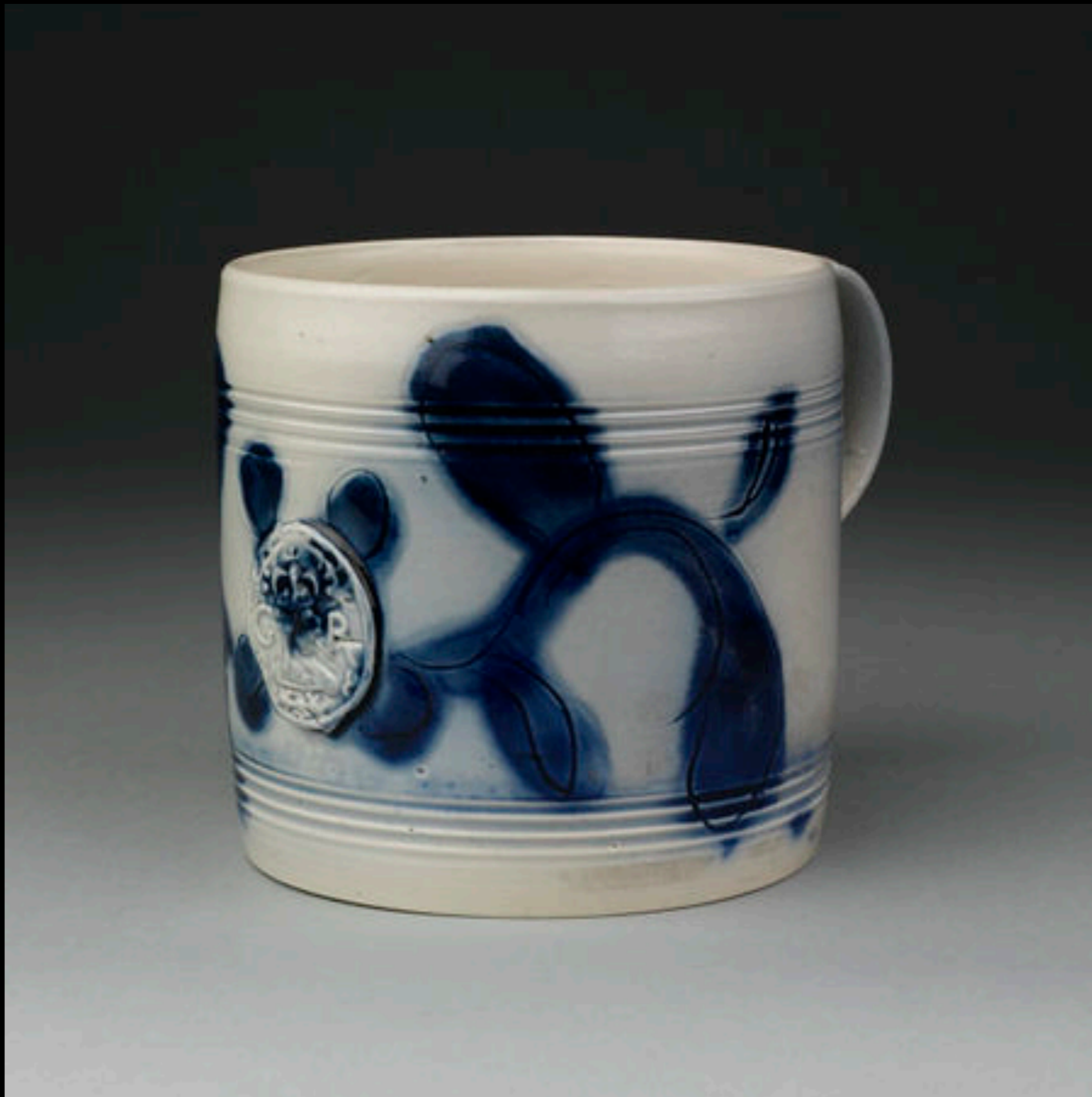
English Salt Glazed Stoneware Mug with Mould - Applied Medallion from Staffordshire