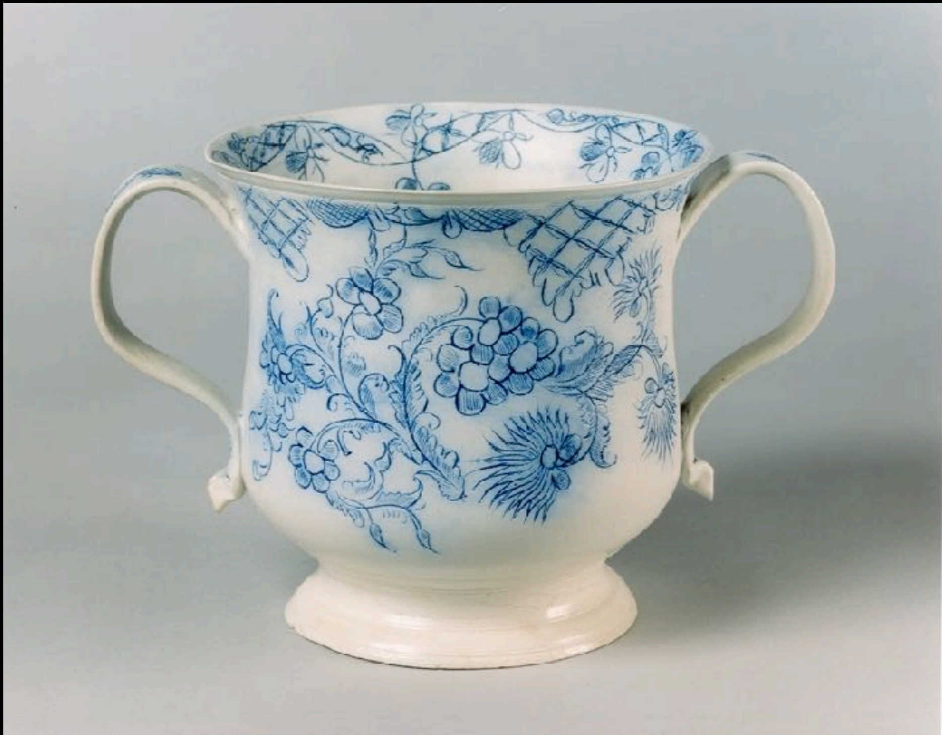
English Salt Glazed Scratch Blue Loving Cup c. 1760 (Private Collection)