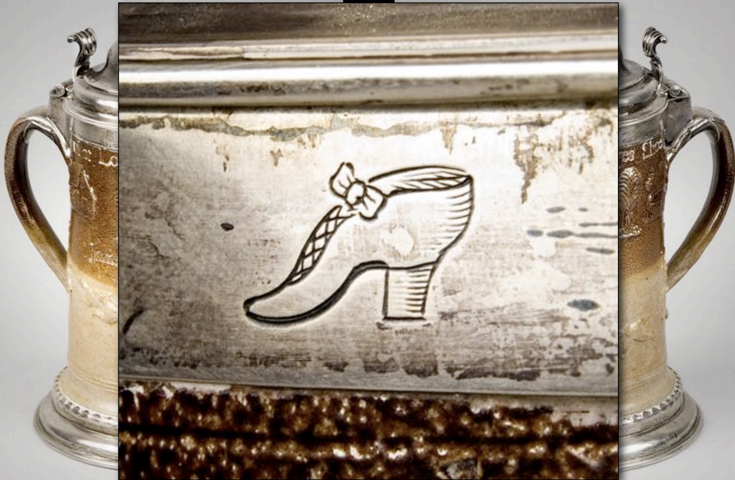
English Salt Glazed Brown Stoneware Tankard with Silver Mounts "See what Love & art can dew by Fiting on a Ladyes Shoe"