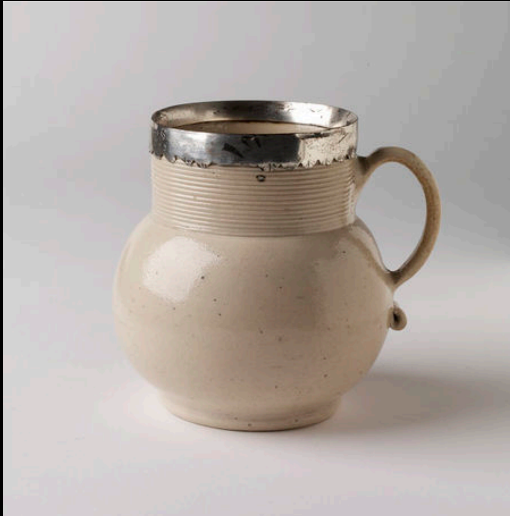
English Salt Glazed Stoneware "Gorge" Mug with Engraved Silver Collar (An Attempt to Copy White Chinese Porcelain) by John Dwight of Fulham 1682 (Victoria & Albert)