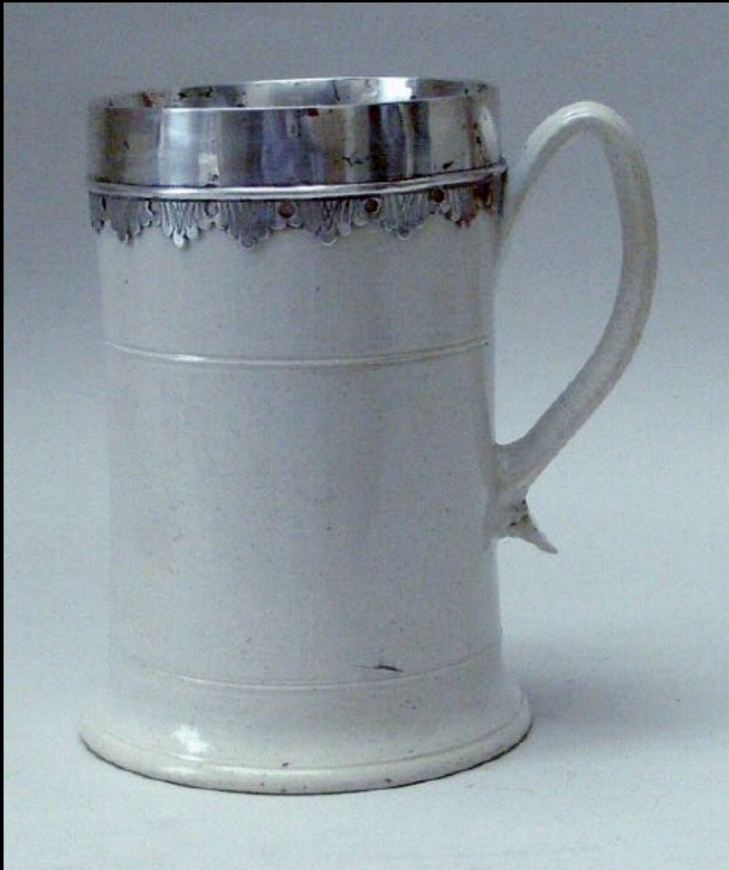
English Staffordshire White Salt Glazed Stoneware Tankard Early to Mid 18th Century (Private Collection)