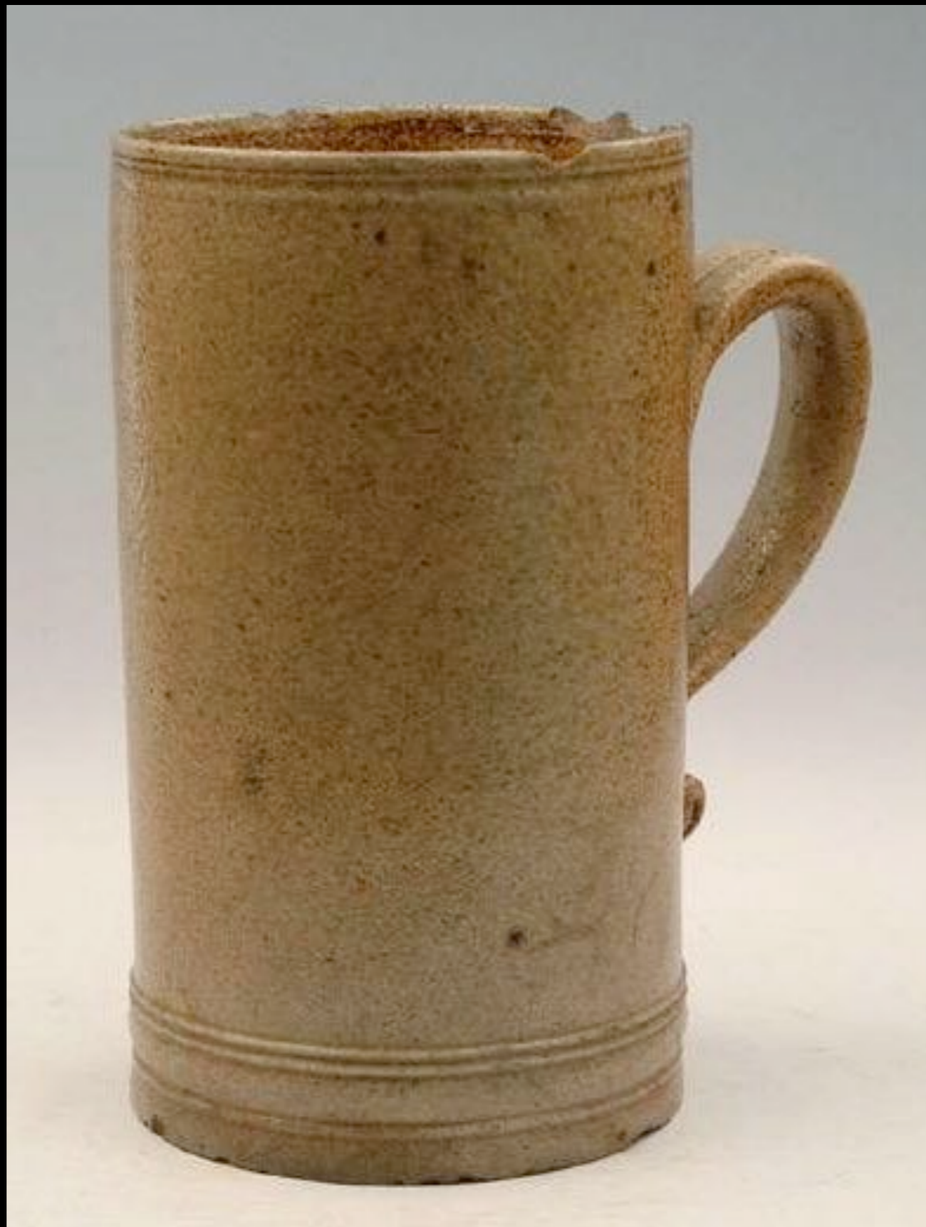
English Stoneware Tankard Stamped with an "AR" Excise Stamp (Queen Anne) from Fulham / Hammersmith