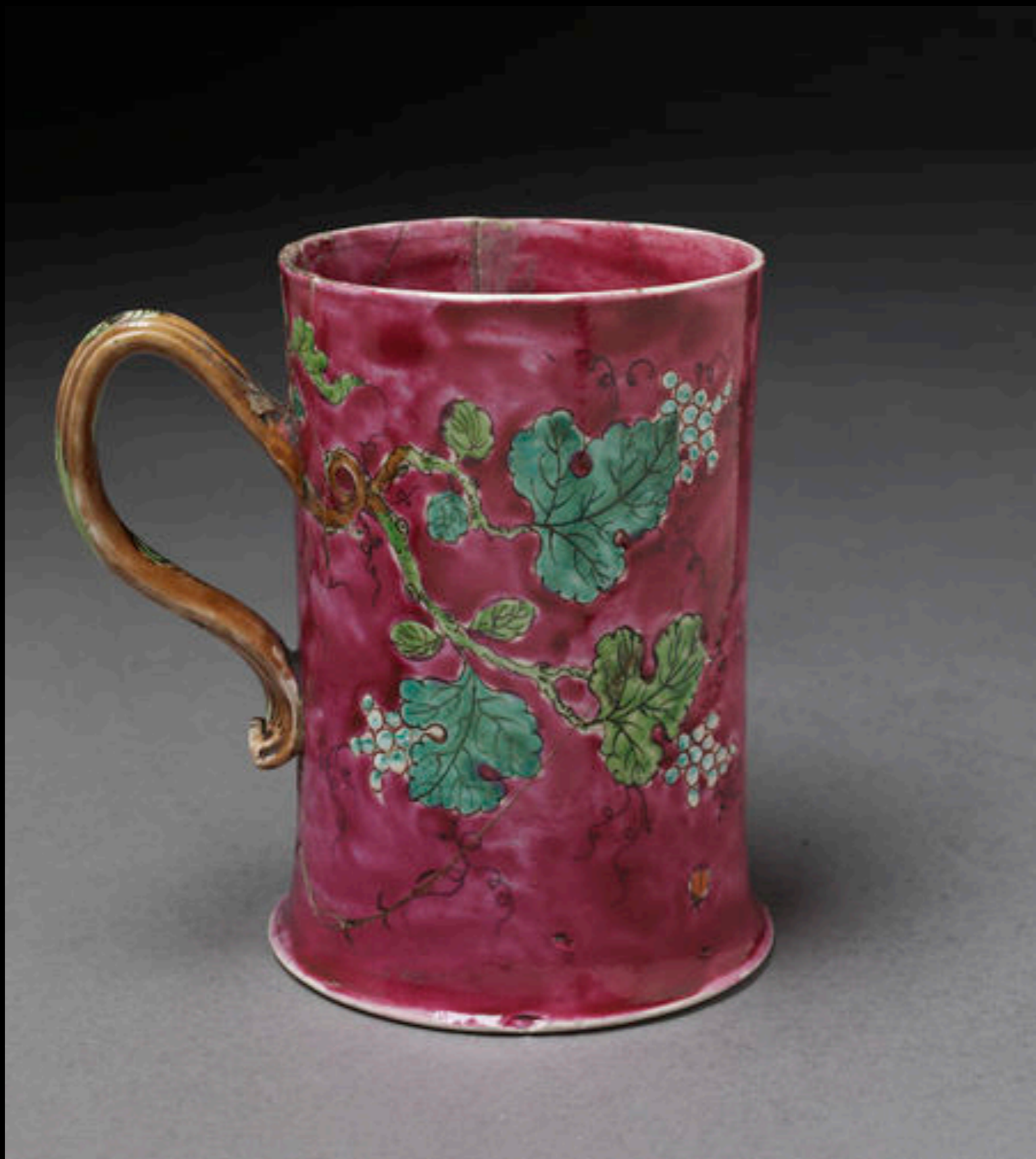
English Salt Glazed Stoneware Mug from Staffordshire