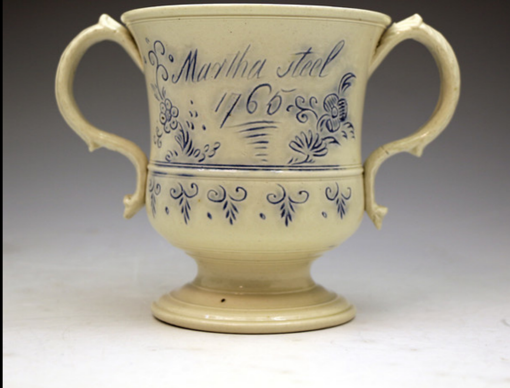
English Salt Glazed Scratch Blue Loving Cup "Martha Steel 1765"