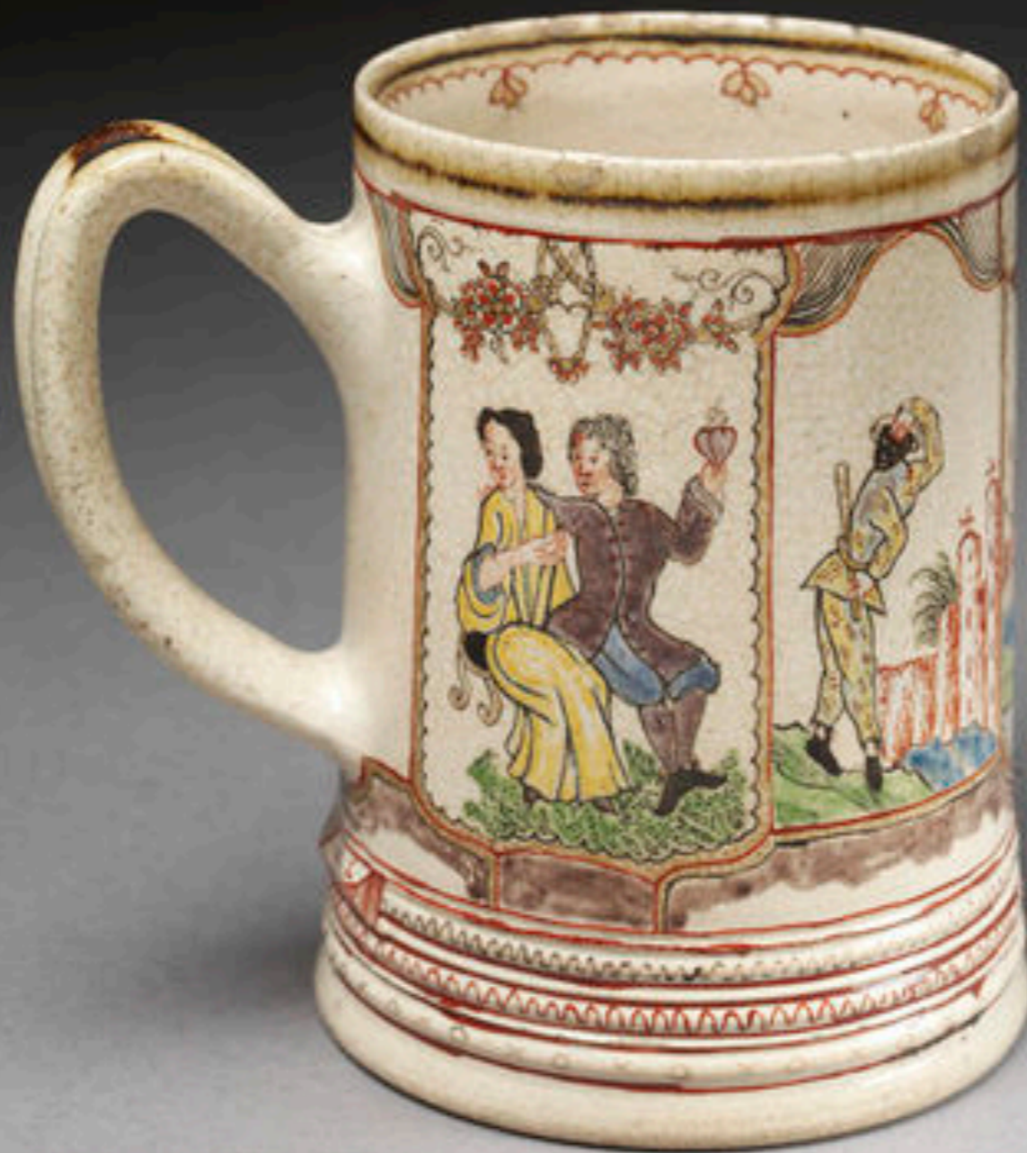
English Salt Glazed Mug from London by Fulham Potter c. 1700 - 1710 & Decorated in 1739 (Victoria & Albert)