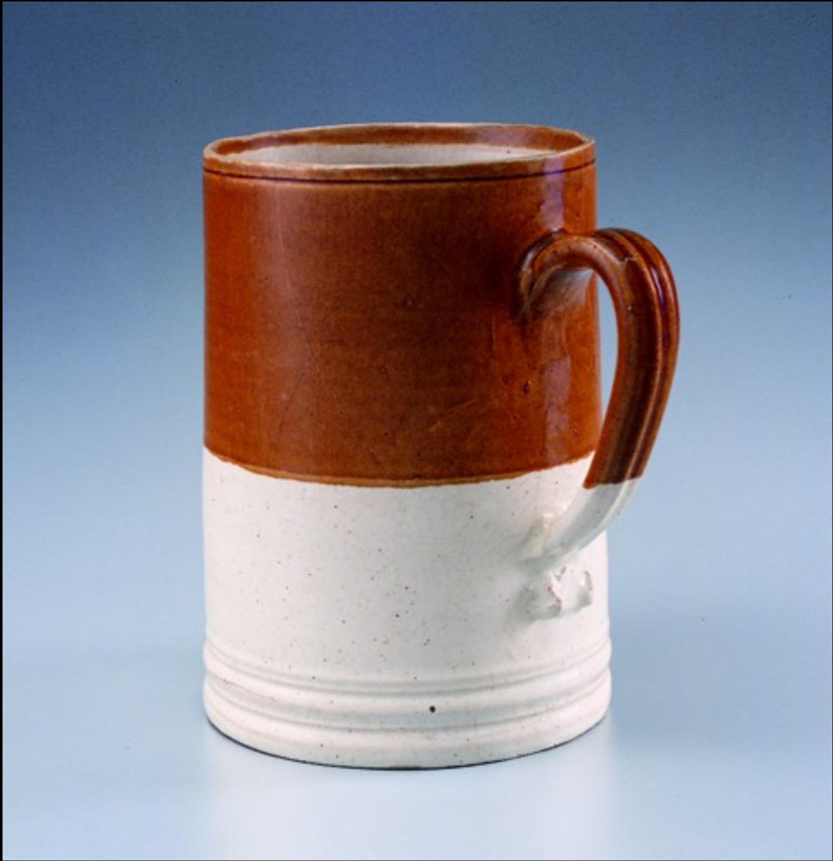
English Salt Glazed Stoneware Mug