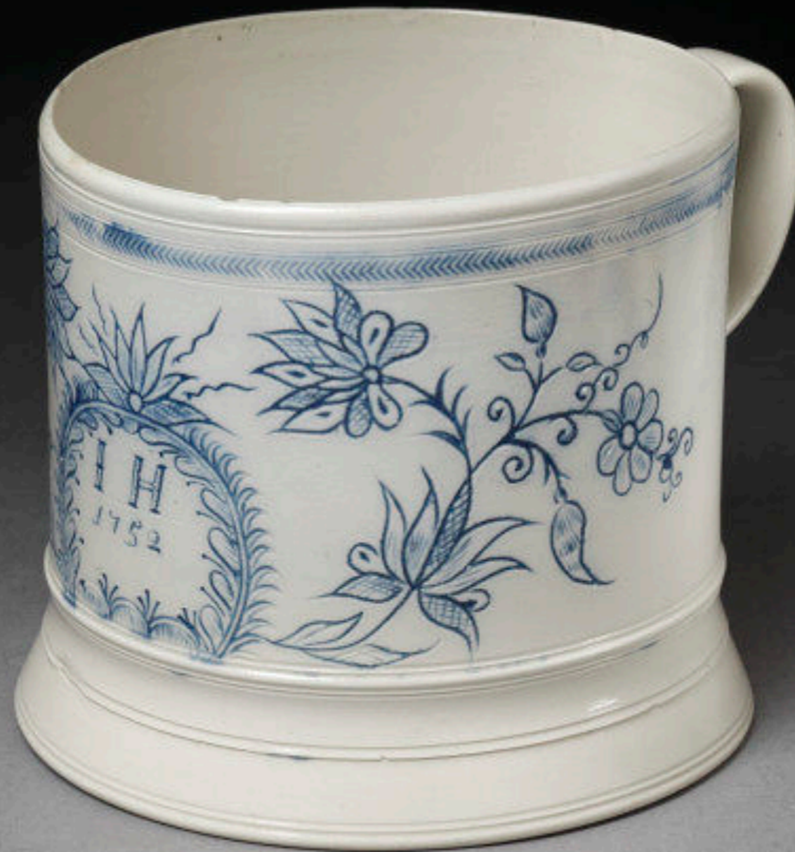
English Staffordshire Scratch Blue Salt Glazed Stoneware Mug