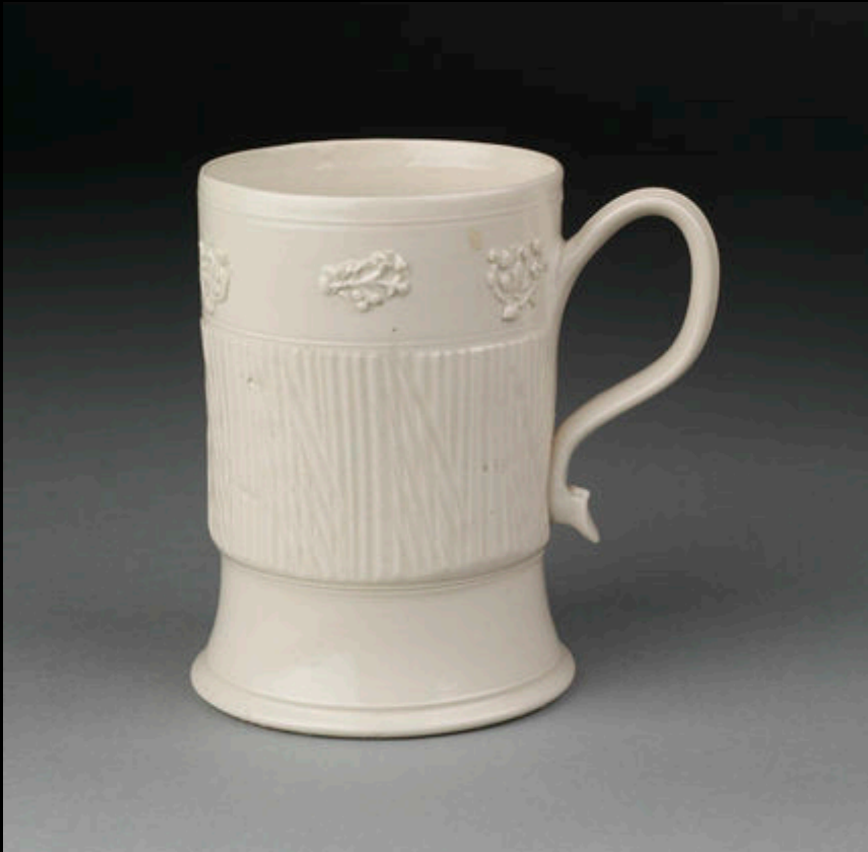
English Salt Glazed Mug from Staffordshire