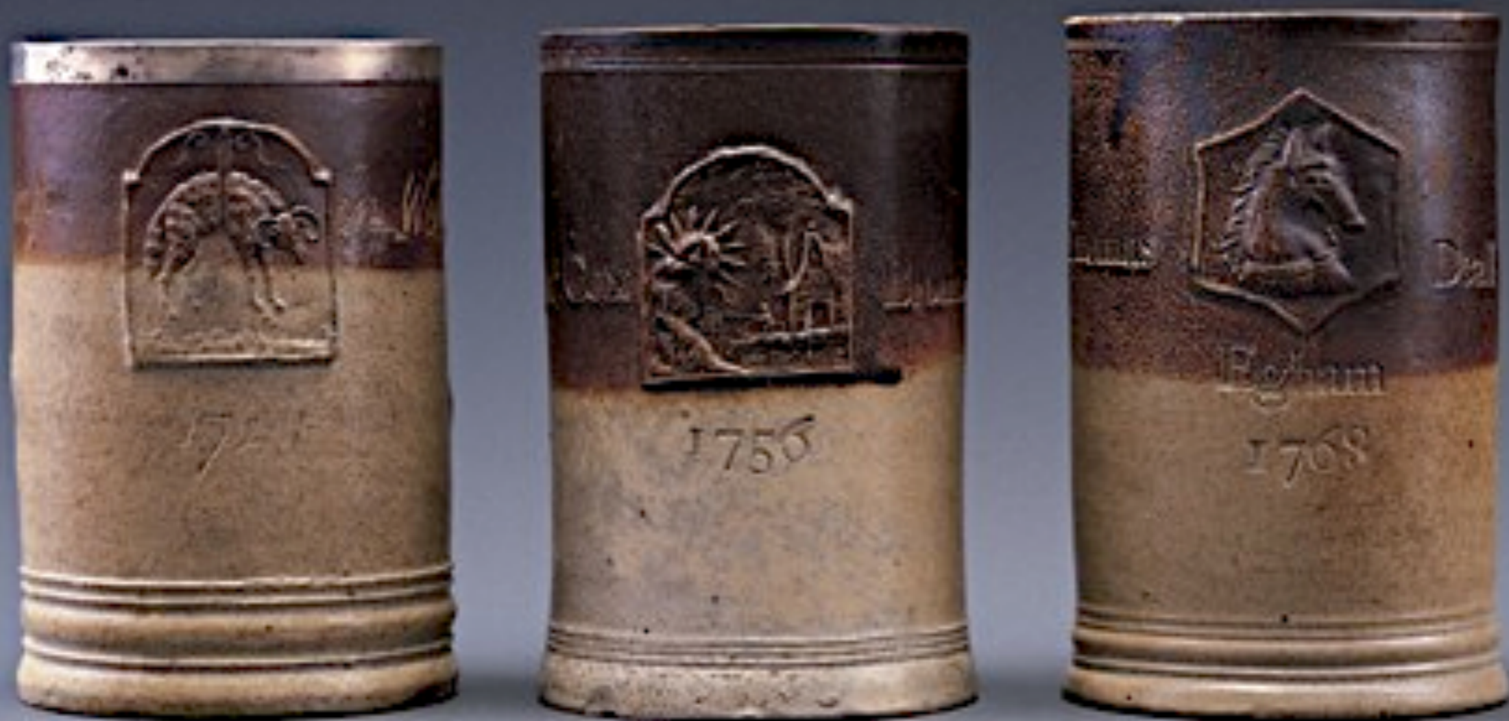
English Salt Glazed Stoneware Mugs with Applied Tavern Signs from London "Jacob Morden 1750" (Chipstone)