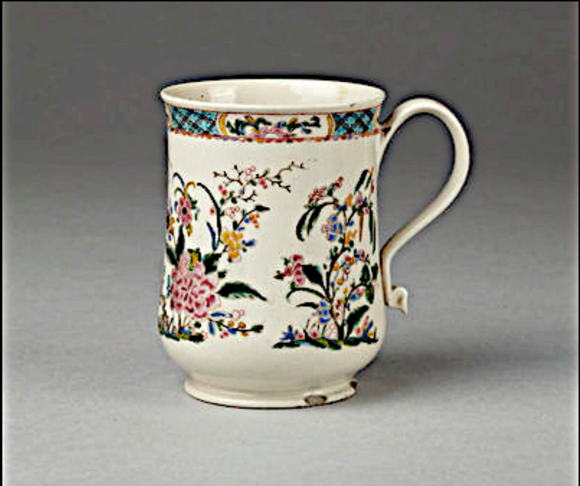
English Salt Glazed Stoneware Mug with Enamelled Colors from Staffordshire c. 1750 - 1760 (Victoria & Albert)