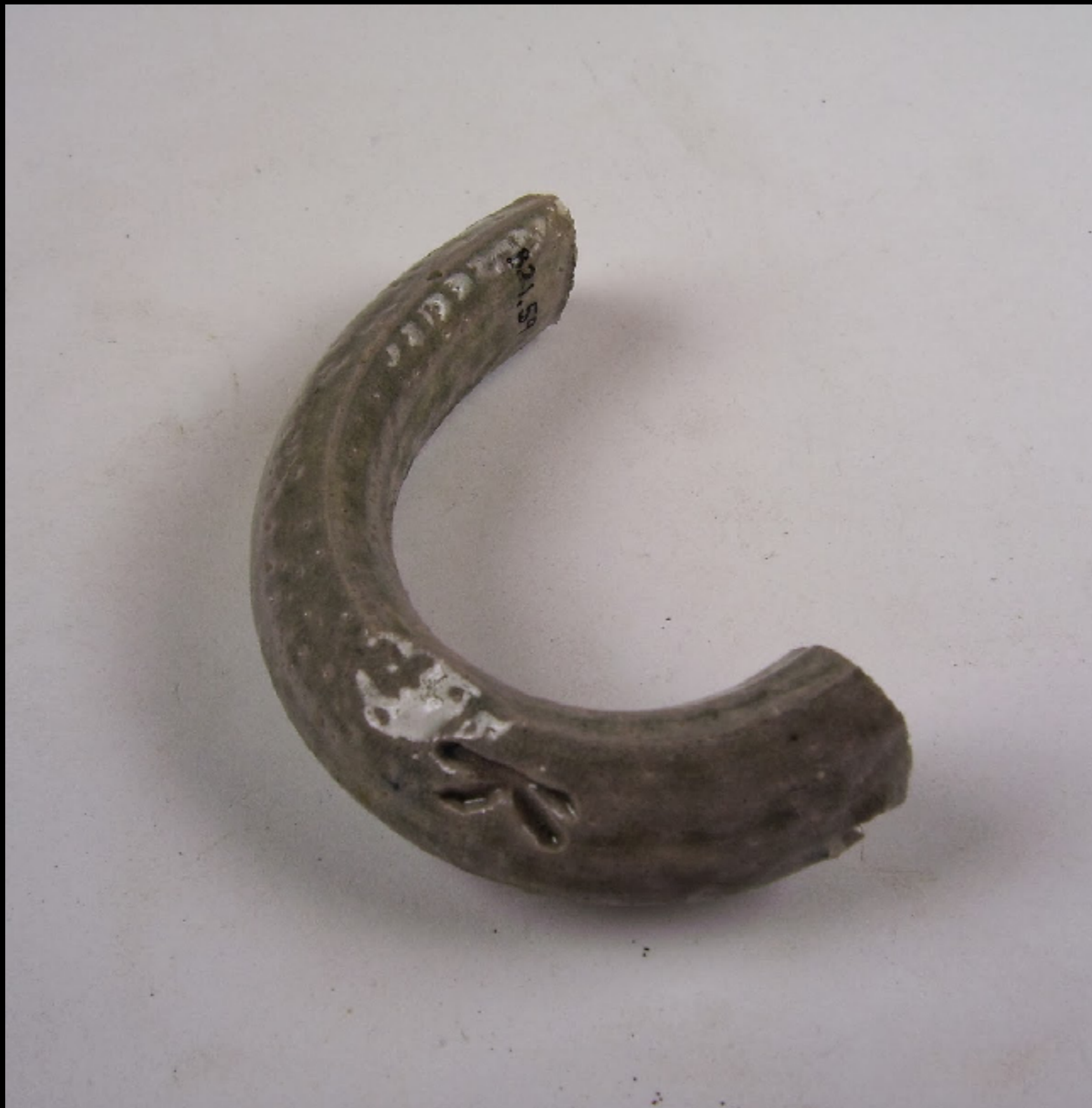
Possibly Foreign Made or American Made Salt Glazed Stoneware Mug Handle from Massachusetts Impressed with a "K" Recovered from Faneuil Hall in Boston, Massachusetts Found in a Context with a Mean Date of 1727