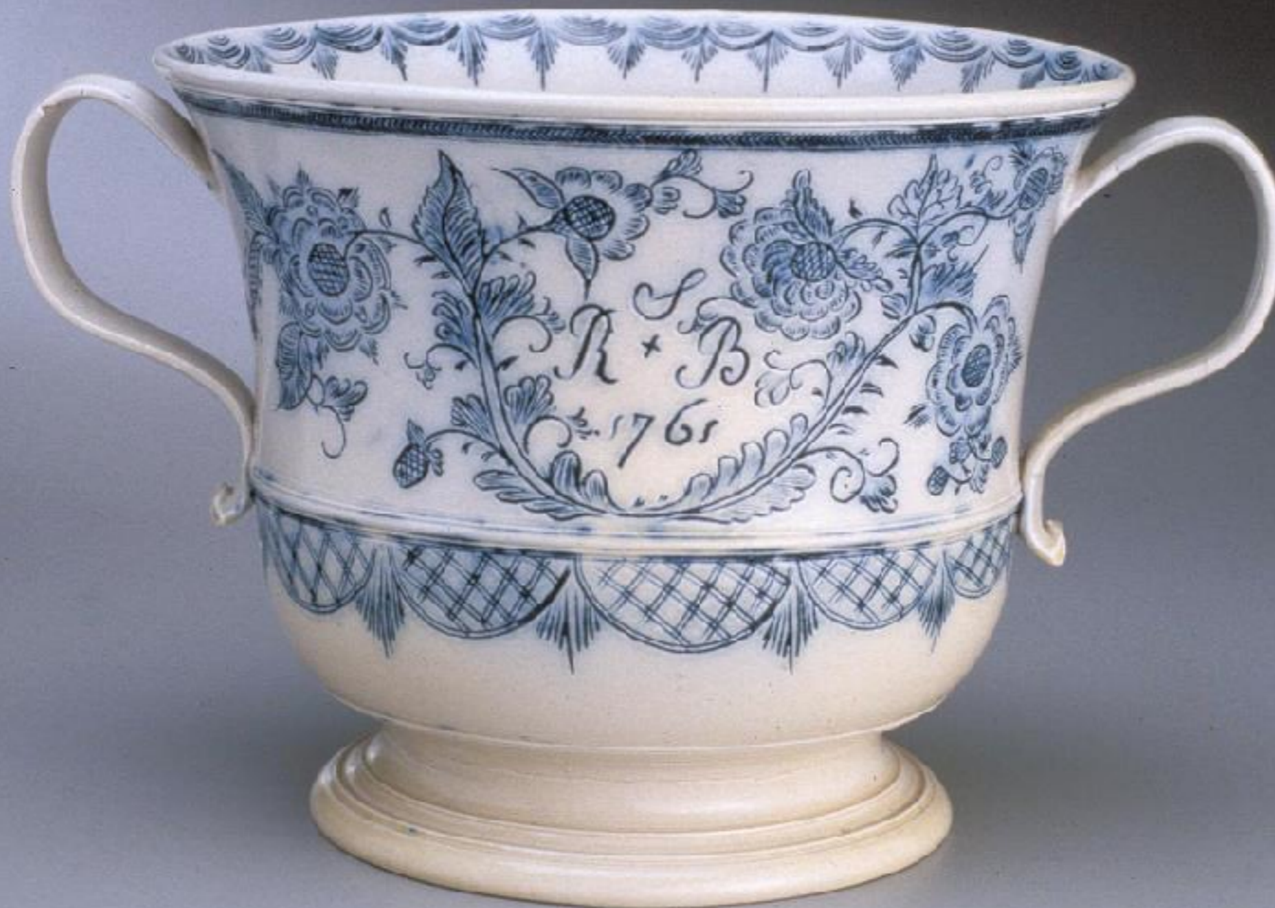
English Salt Glazed Scratch Blue Loving Cup "S/R+B 1761"