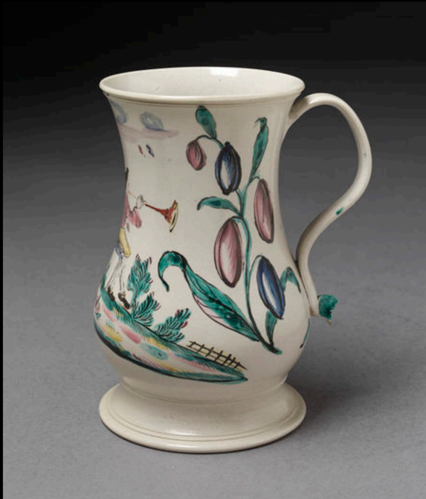
English Salt Glazed Stoneware Mug with Enameled Colors from Staffordshire 1765 (Victoria & Albert)