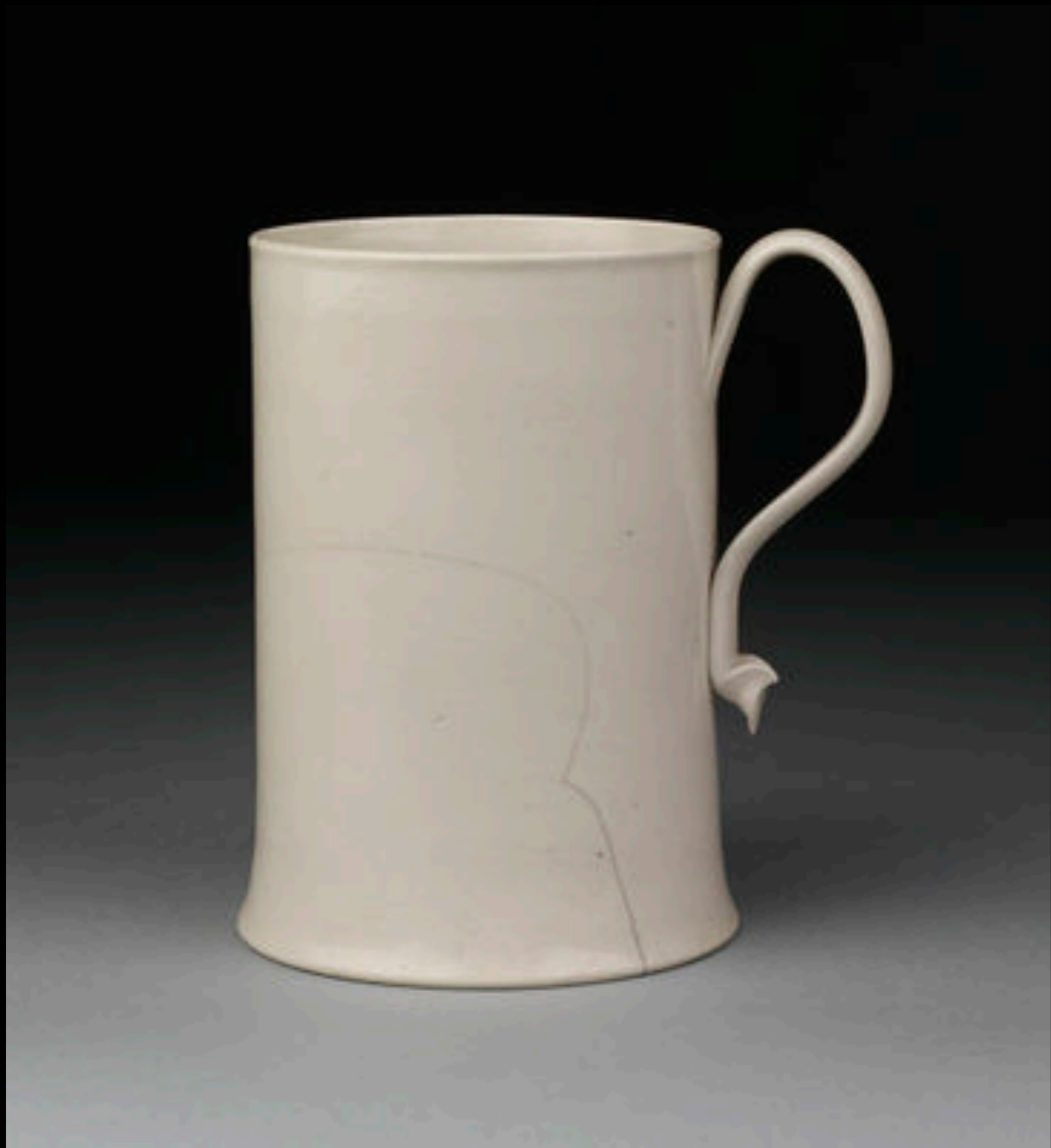
English Salt Glazed Mug from Staffordshire c. 1760 (Victoria & Albert)