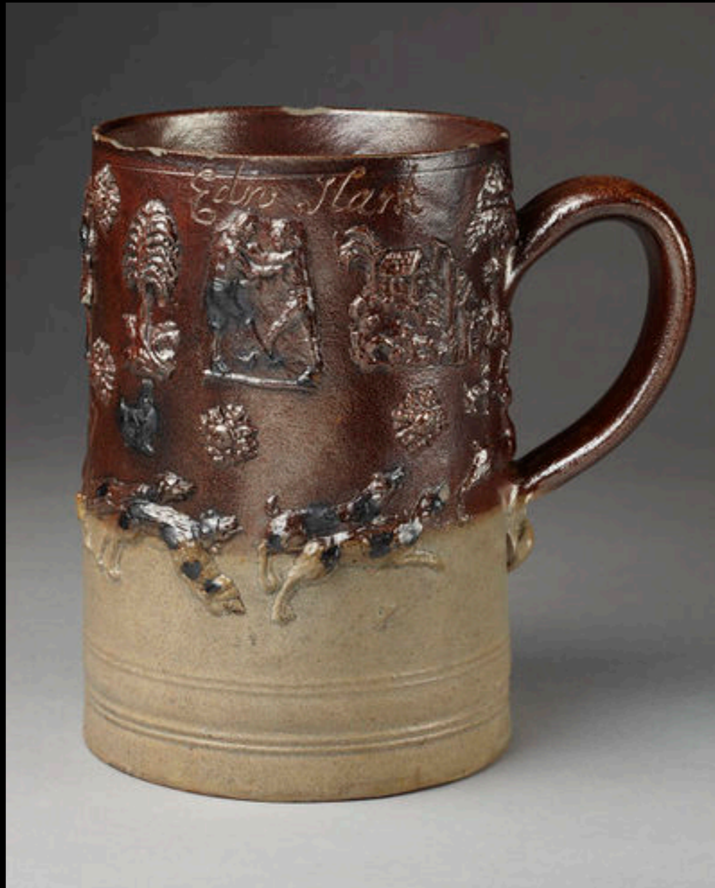
English Salt Glazed Stoneware Mug from London by "Factory B" c. 1727 (Victoria & Albert)