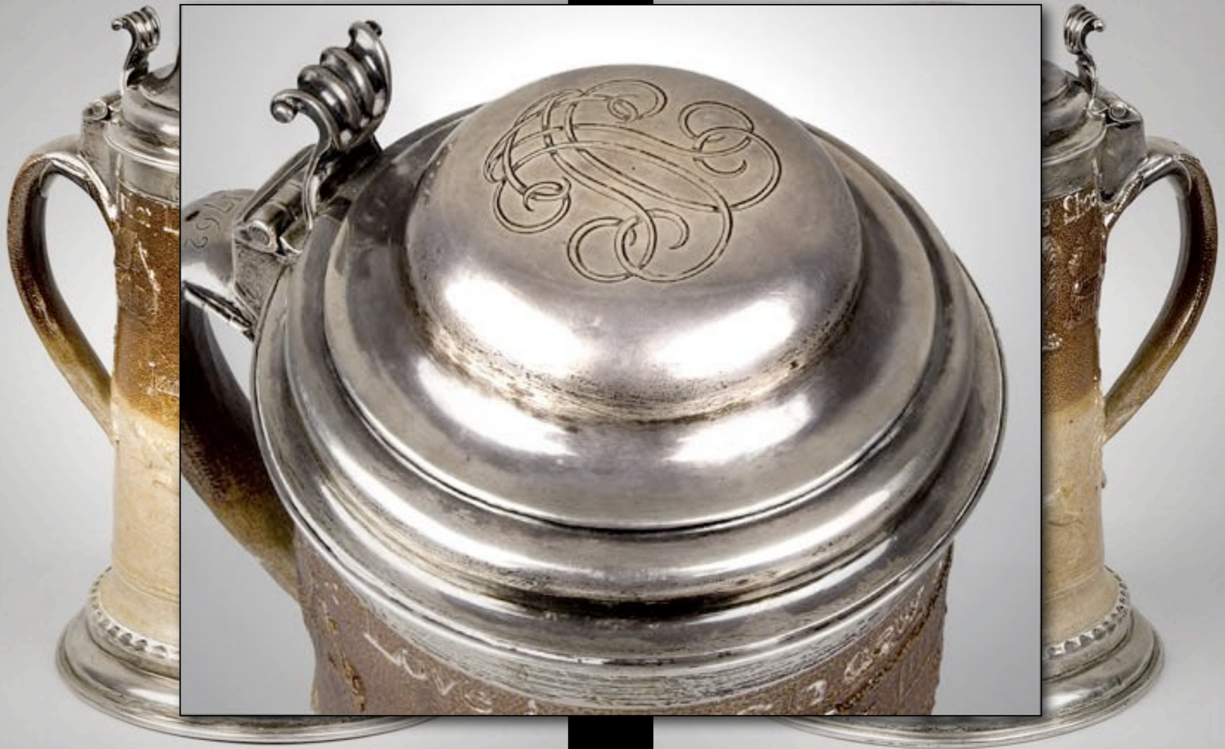
English Salt Glazed Brown Stoneware Tankard with Silver Mounts "See what Love & art can dew by Fiting on a Ladyes Shoe"