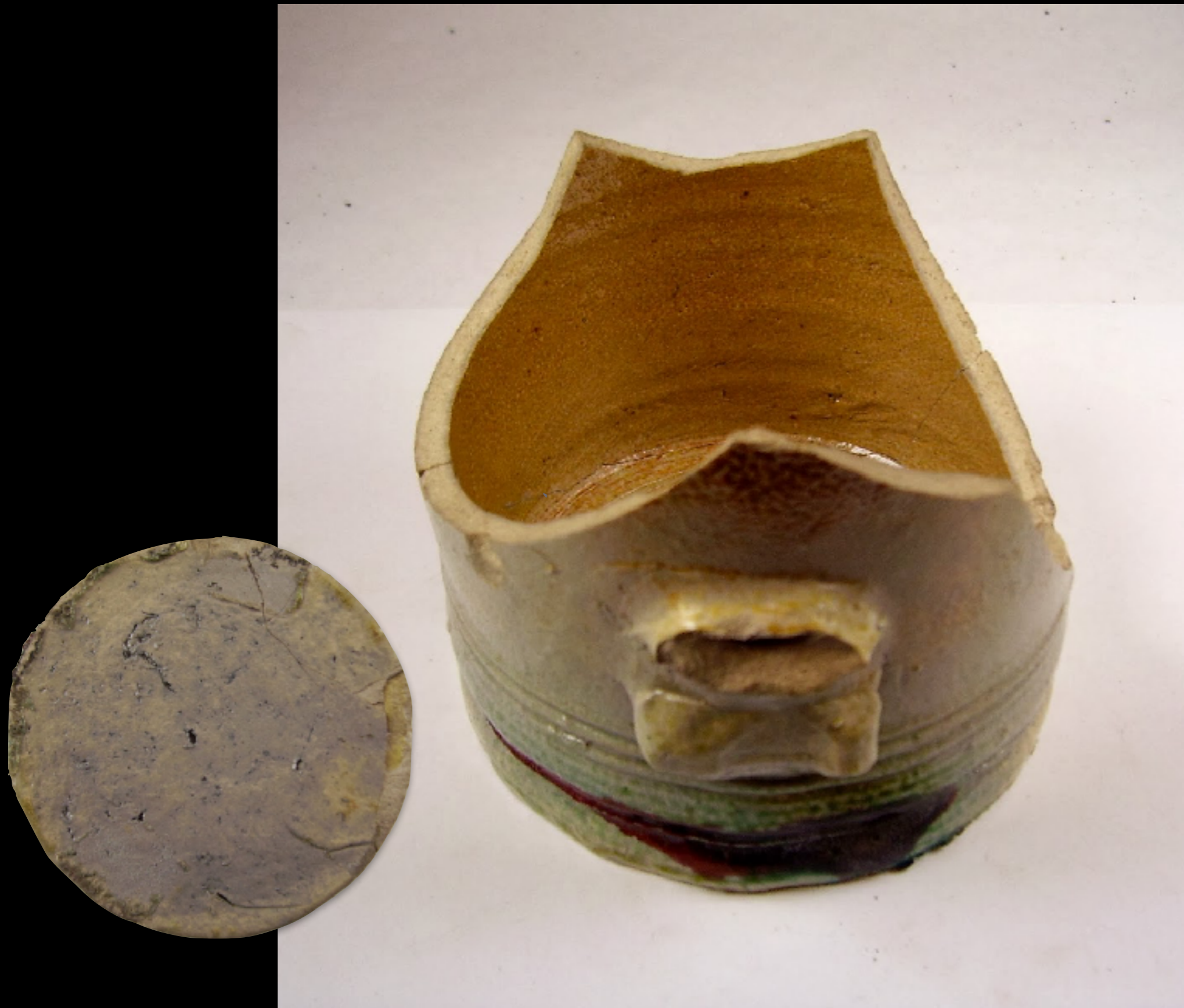
Possibly American Made Salt Glazed Stoneware Mug from Charlestown, Massachusetts Recovered in Charlestown, Massachusetts, and Possibly Made in Charlestown Mid 18th Century