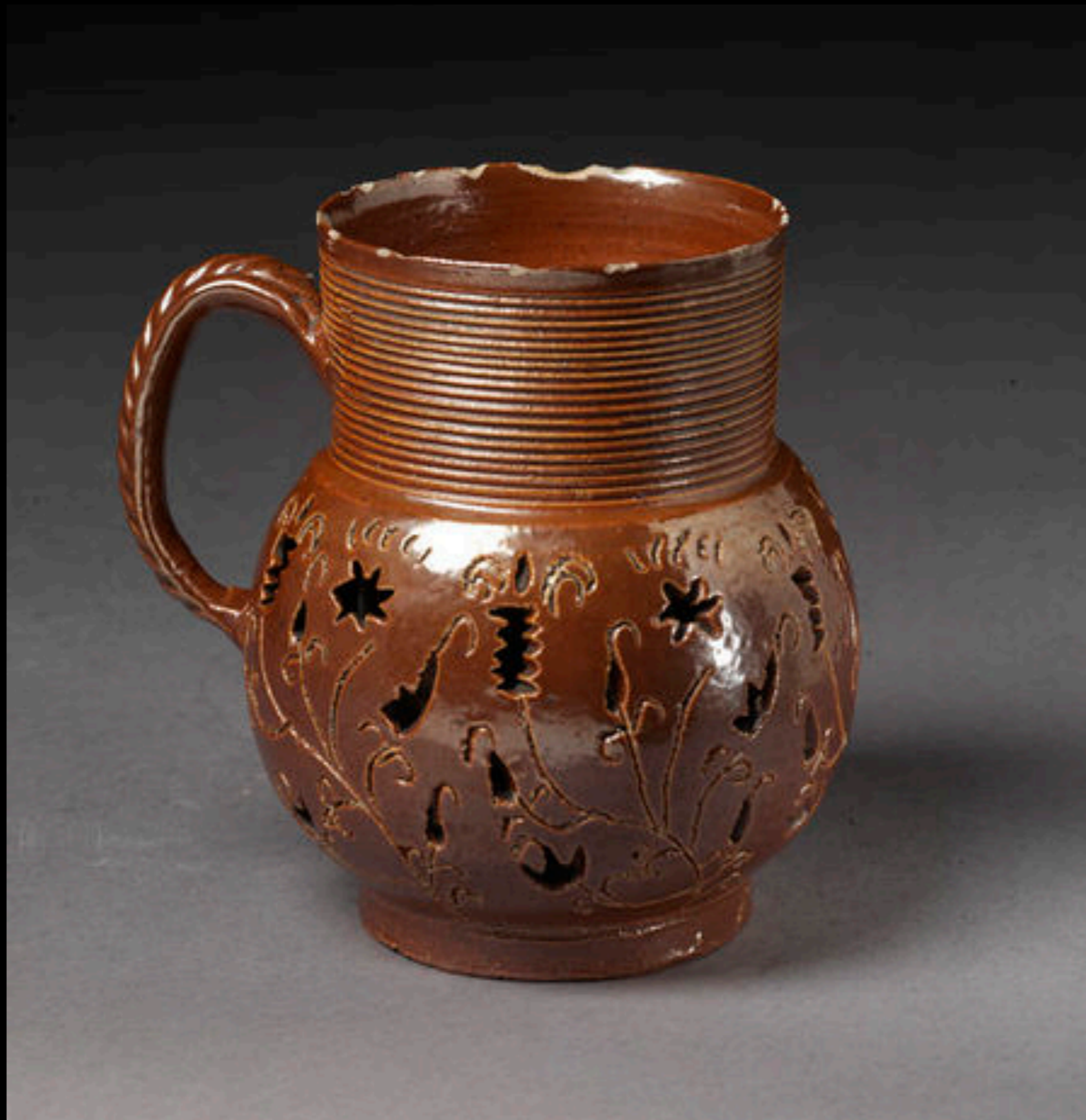
English Salt Glazed Stoneware "Gorge" Mug from Nottingham