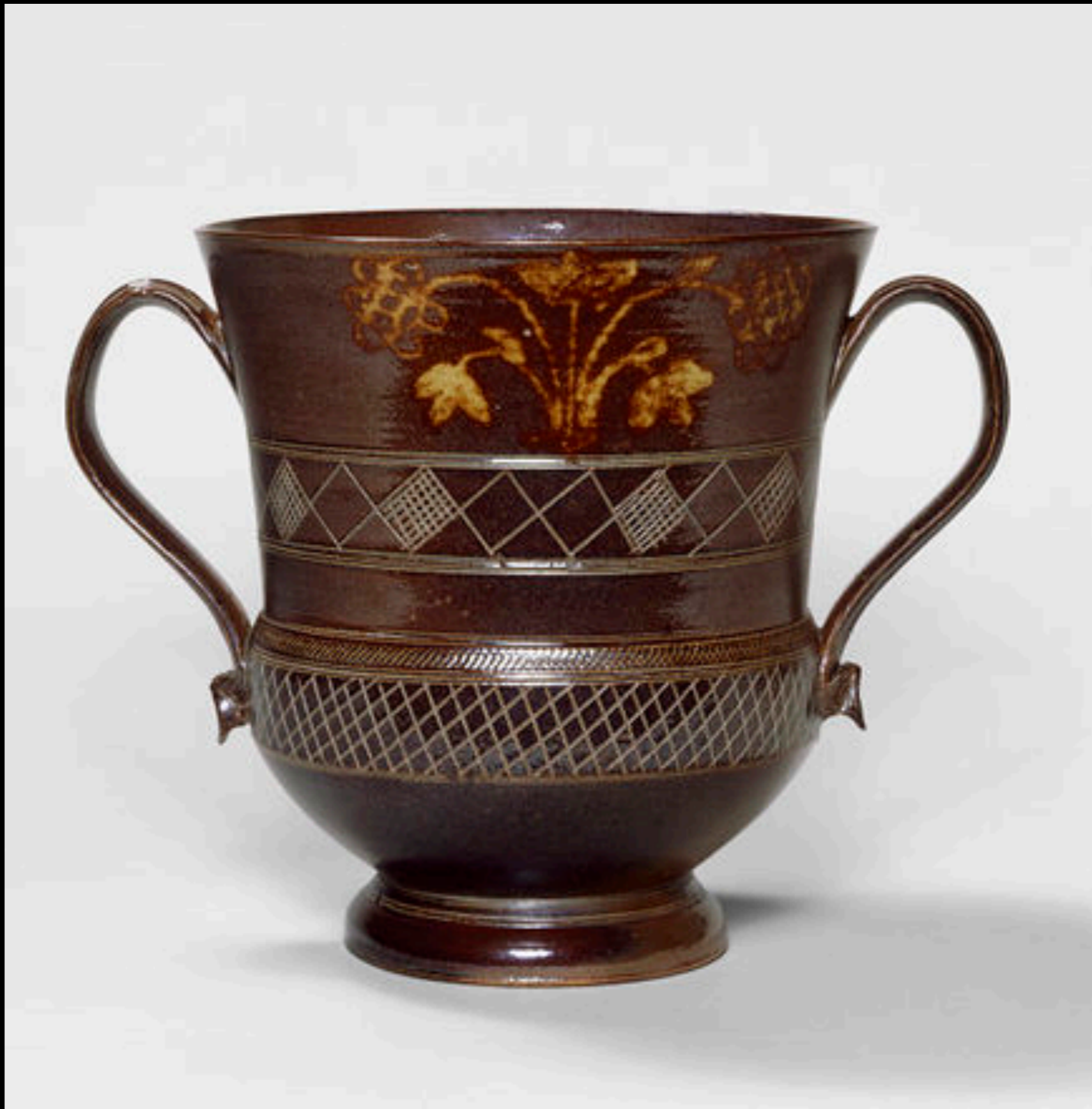
English Salt Glazed Loving Cup from Nottingham