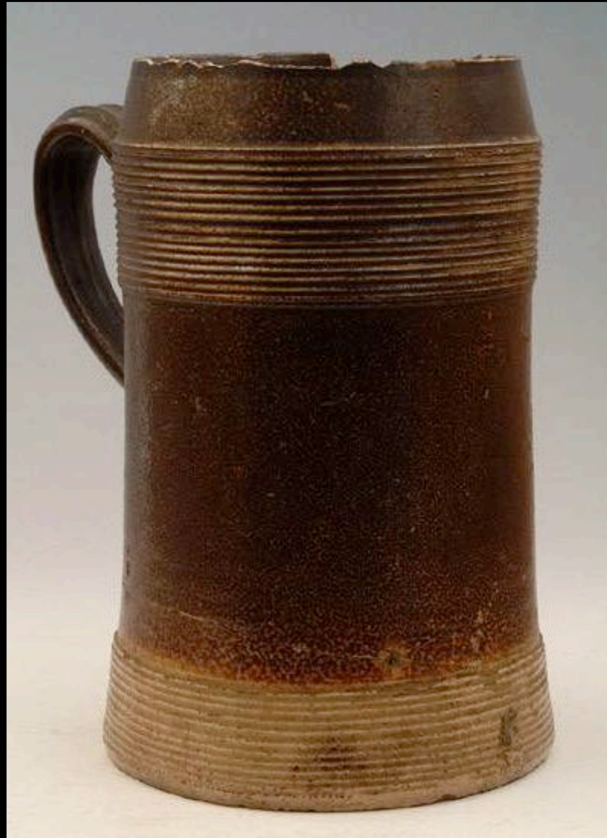
English Stoneware Salt Glazed Tankard from Fulham / Hammersmith c. 1671 - 1703 (Museum of London)