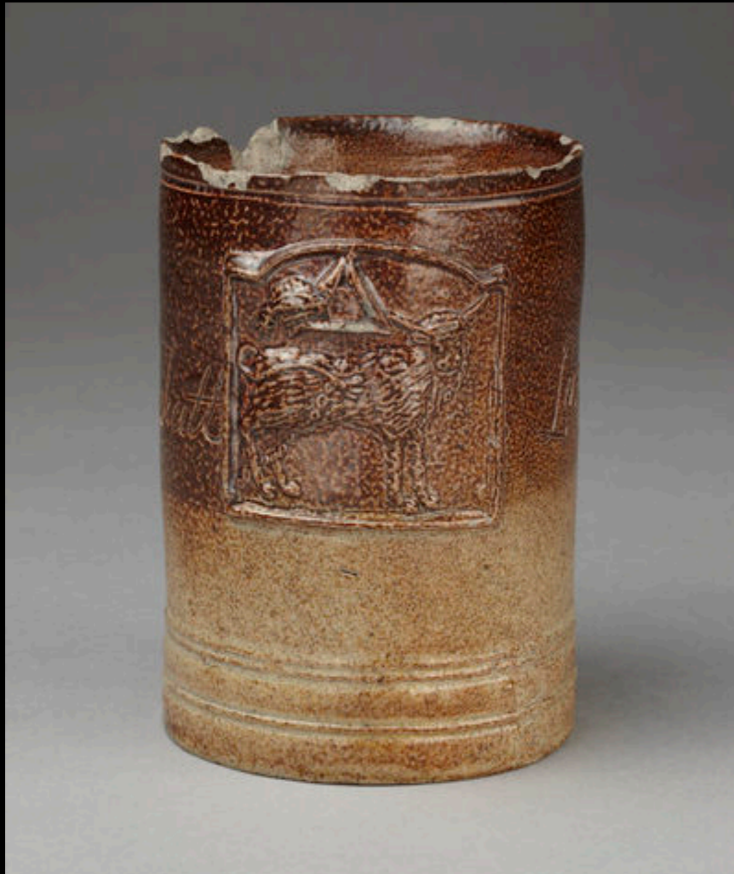
English Salt Glazed Stoneware Mug with Applied Tavern Sign from Bristol Possibly from Southwark Possibly Made at Gravel Lane c. 1724 (Victoria & Albert)