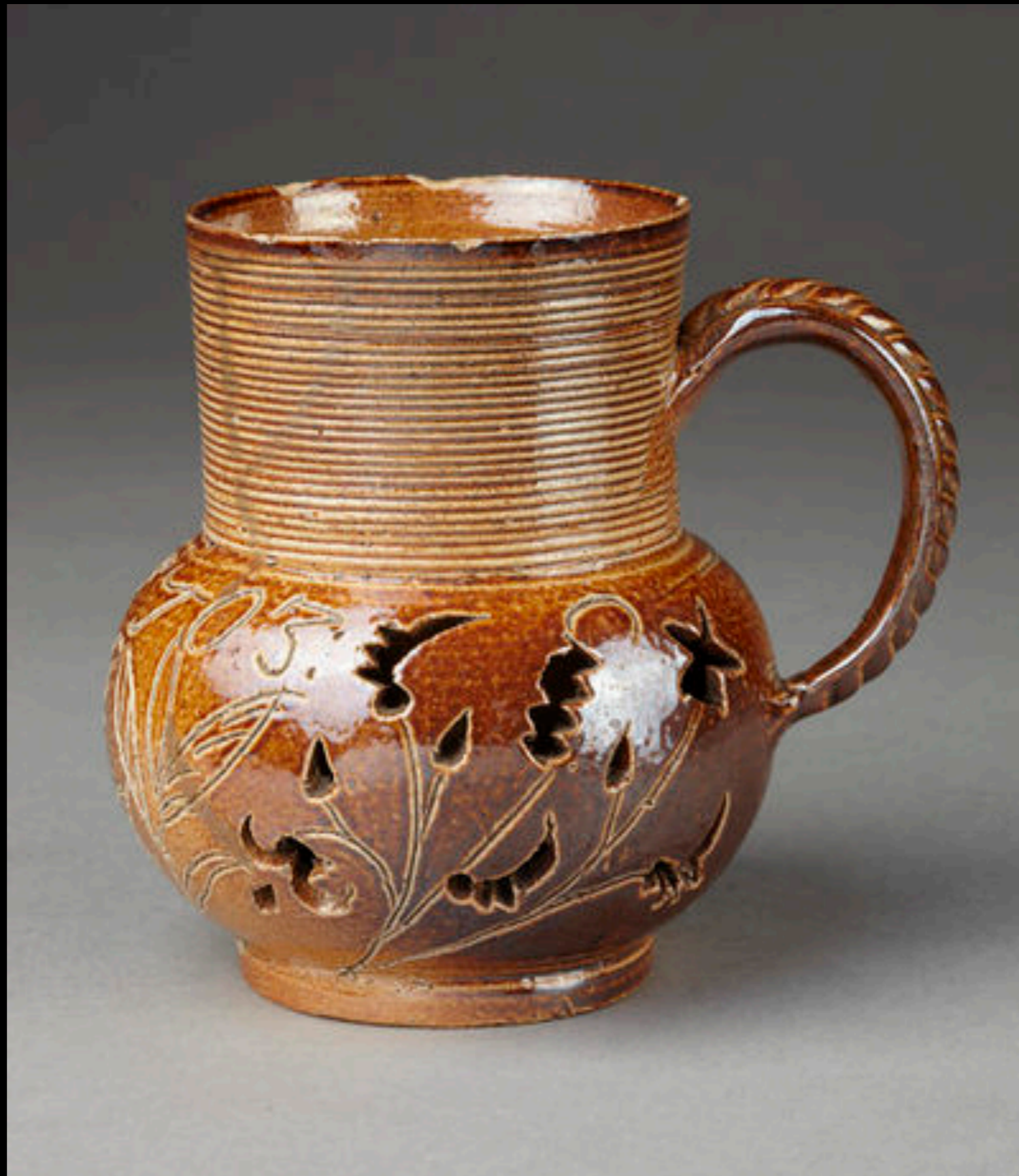
English Salt Glazed Stoneware "Gorge" Mug from Nottingham