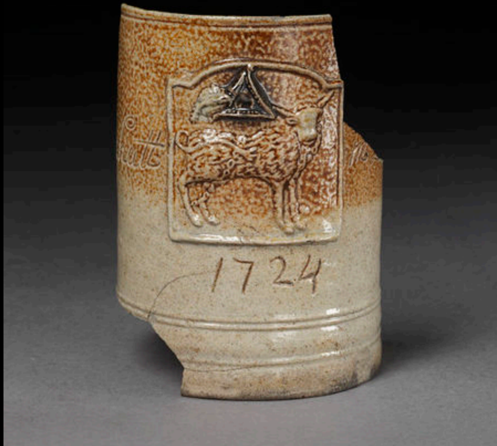
English Salt Glazed Stoneware Mug with Applied Tavern Sign from Bristol Possibly from Southwark Possibly Made at Gravel Lane 1724 (Victoria & Albert)