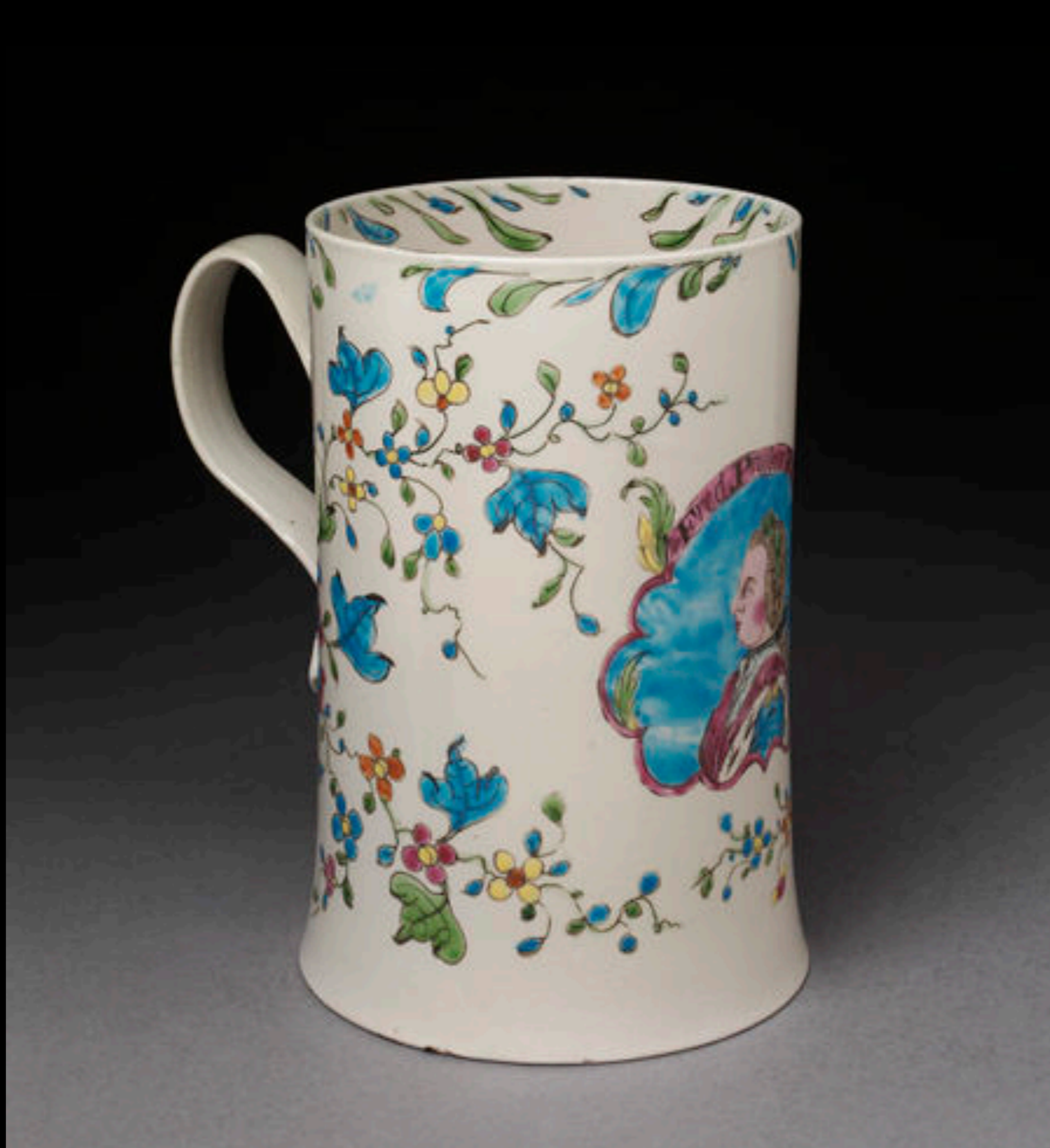
English Salt Glazed Stoneware Mug with Enamelled Colors from Staffordshire 1765 (Victoria & Albert)