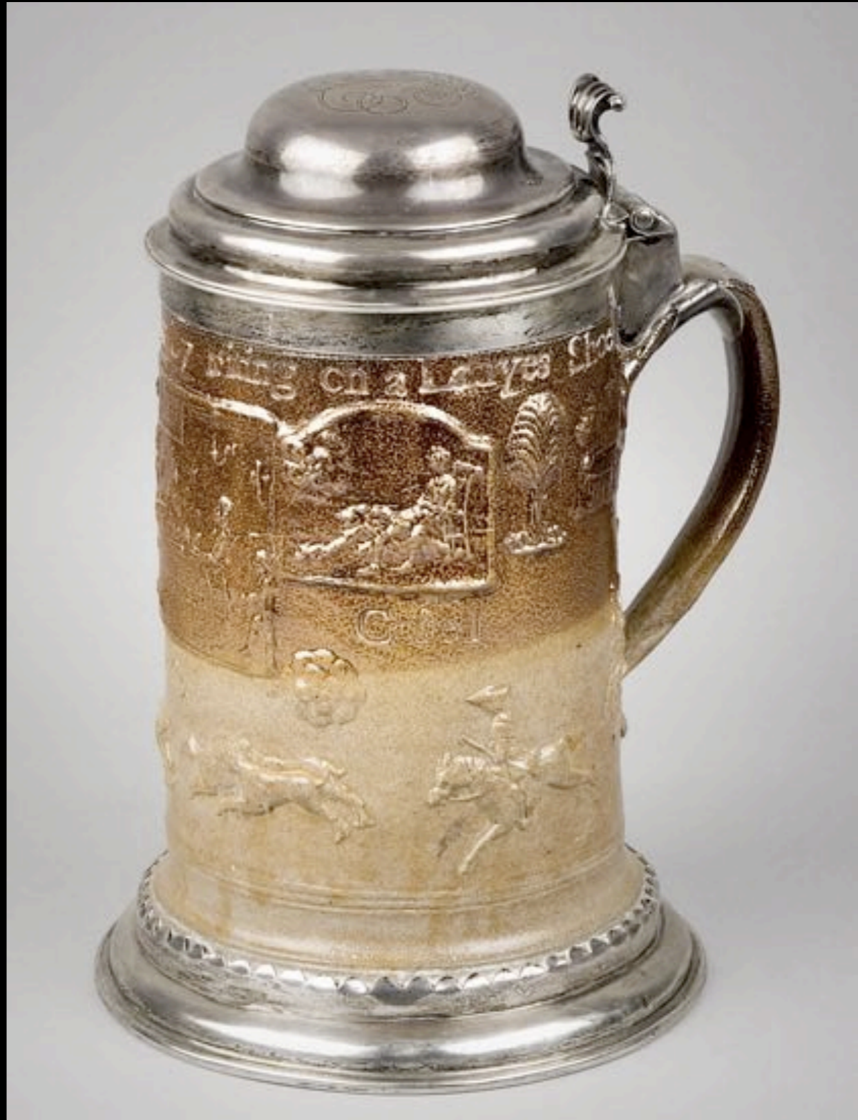
English Salt Glazed Brown Stoneware Tankard with Silver Mounts "See what Love & art can dew by Fiting on a Ladies Shoe"