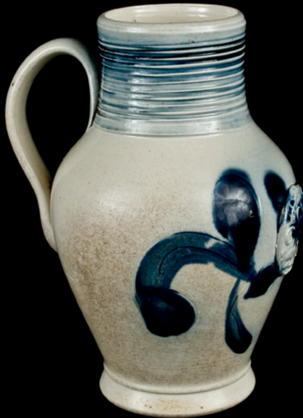
English Salt Glazed Stoneware Mug with Mould - Applied "GR" Medallion (King George III) from Staffordshire