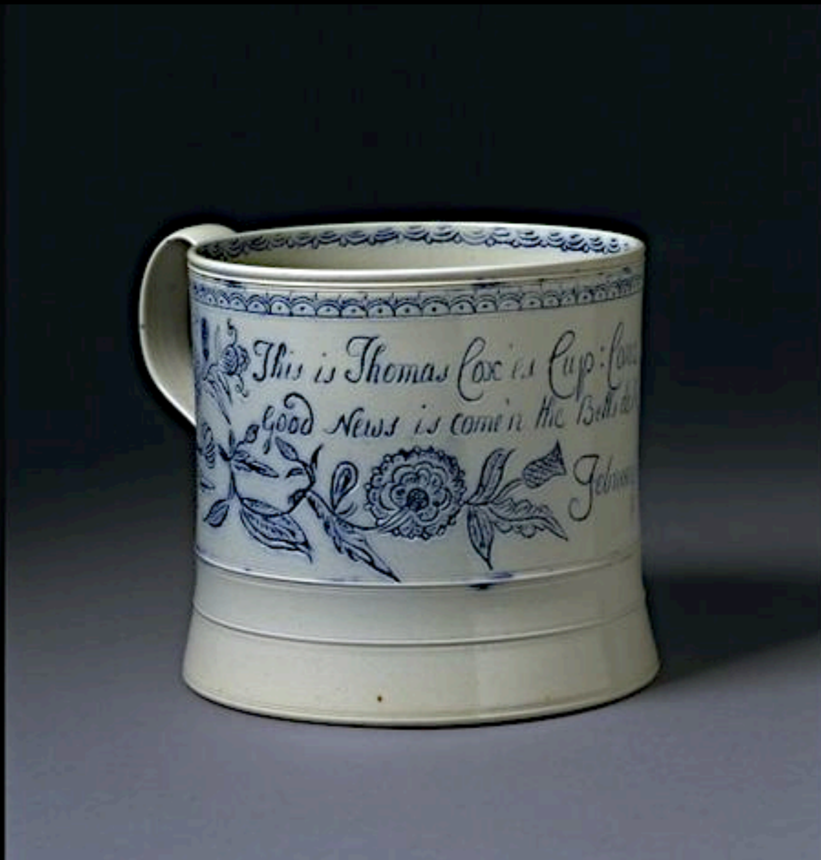
English Staffordshire Scratch Blue Salt Glazed Stoneware Mug 1758 (Victoria & Albert)