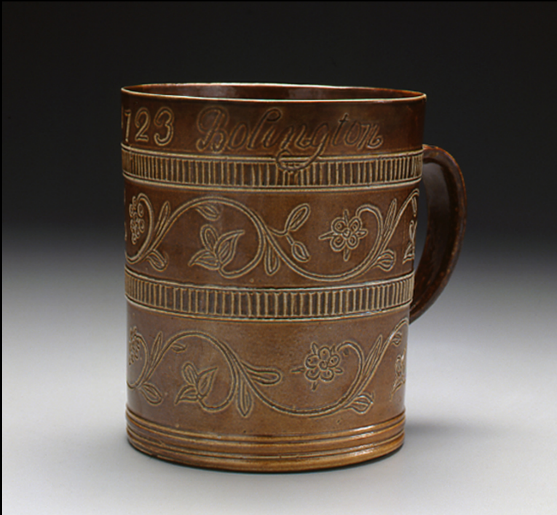
English Salt Glazed Stoneware Mug from Nottingham