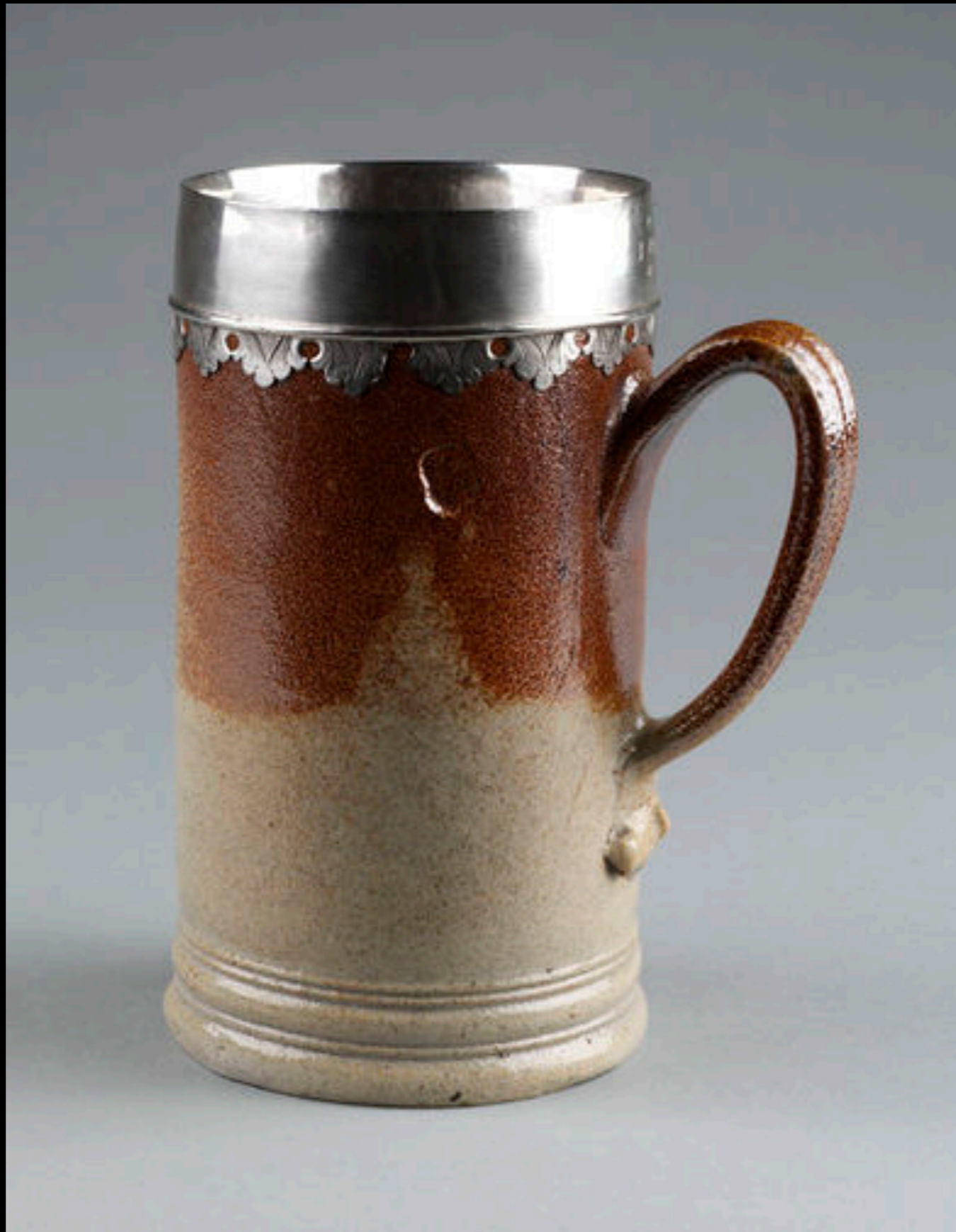
English Salt Glazed Stoneware Mug with a Silver Mount from Southwark or Lambeth