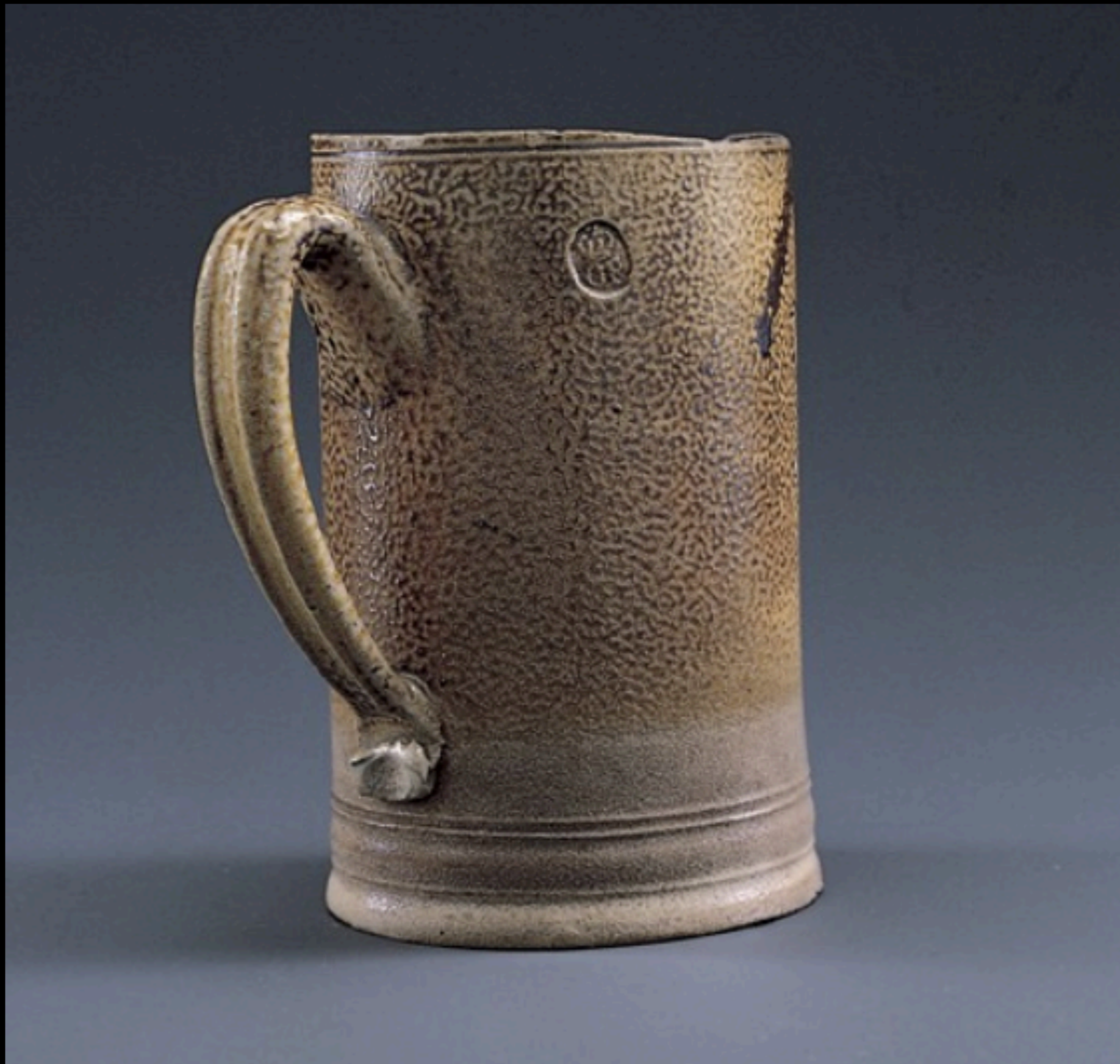
English Salt Glazed Stoneware Mug with “GR” Excise Stamp Within an Oval from Bristol (“GR” Stamps were only adopted by Stoneware Manufacturers from Bristol) 1719 (Chipstone)