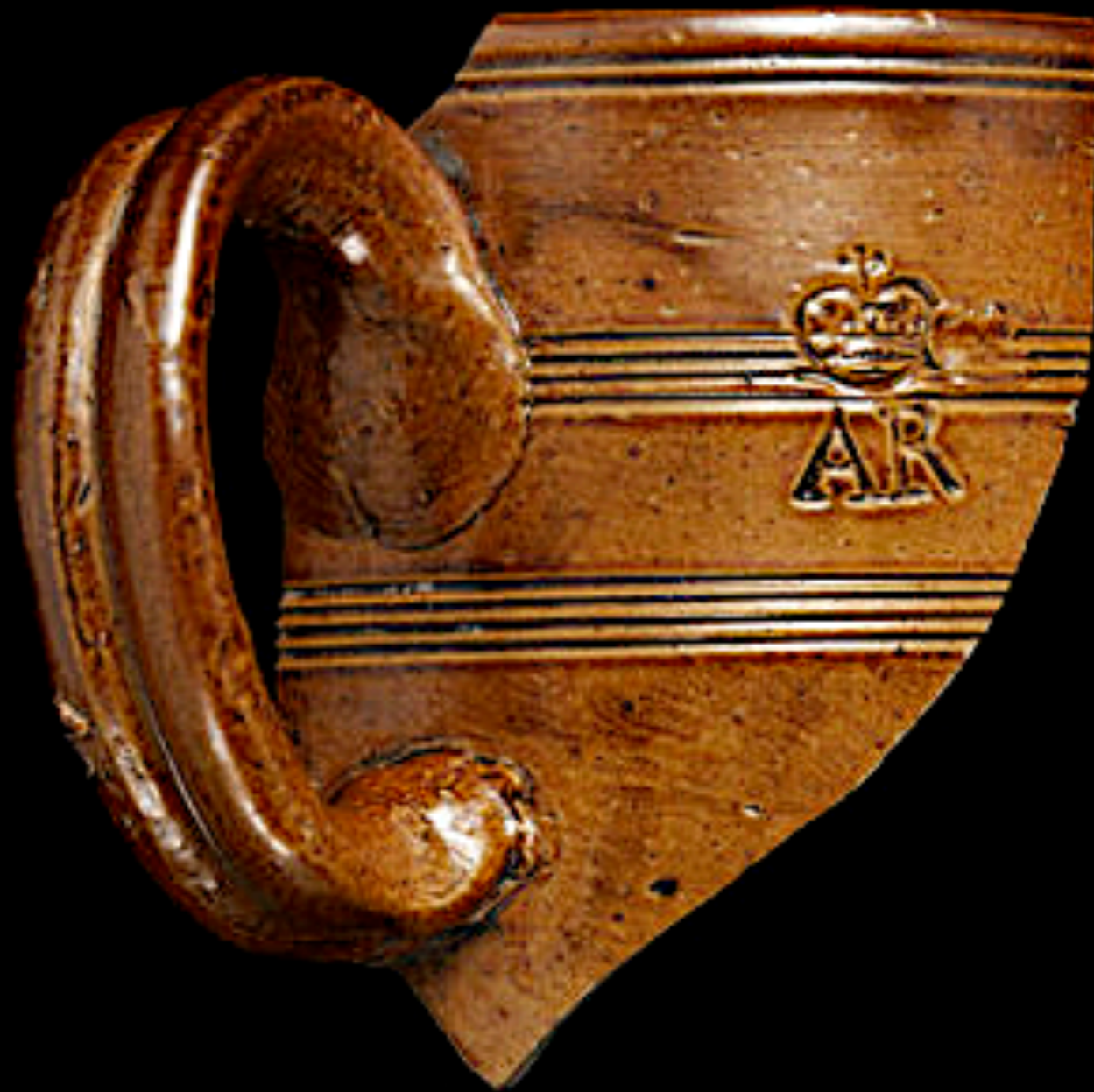
English Stoneware Tankard (Shard) Stamped with an "AR" Excise Stamp (Queen Anne) from Burslem c. 1710 (Victoria & Albert)