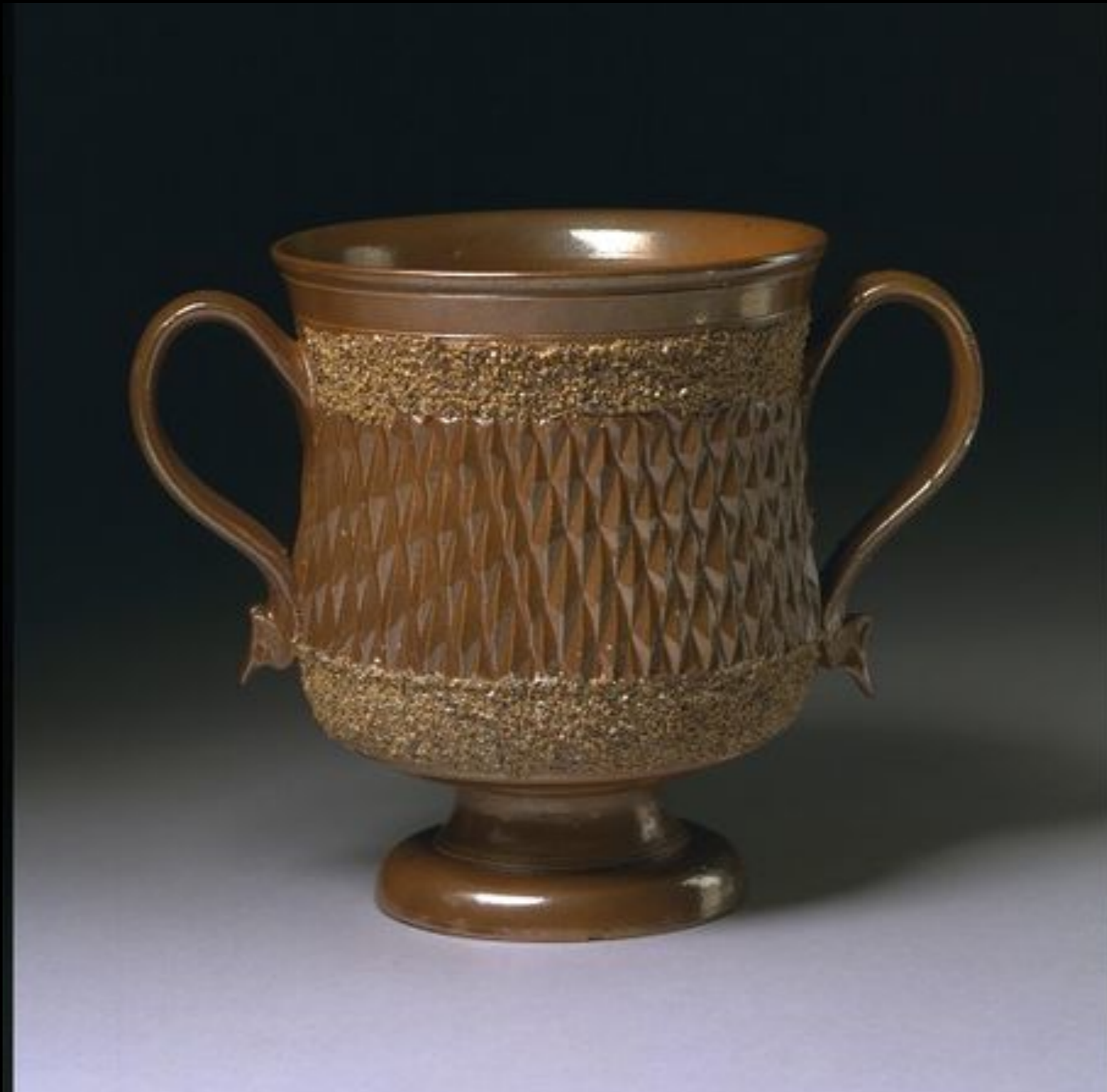
English Salt Glazed Loving Cup from Nottingham