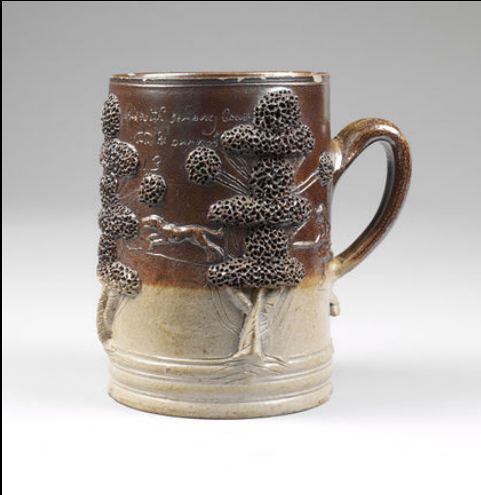
English Salt Glazed Stoneware Mug from Vauxhill