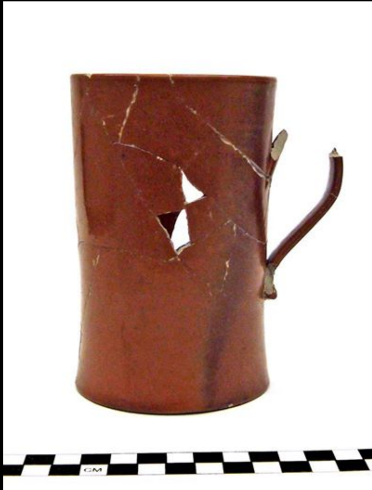
English Nottingham Stoneware Tankard Recovered from the Privy of the Three Cranes Tavern in Charlestown, Massachusetts Mid 18th Century