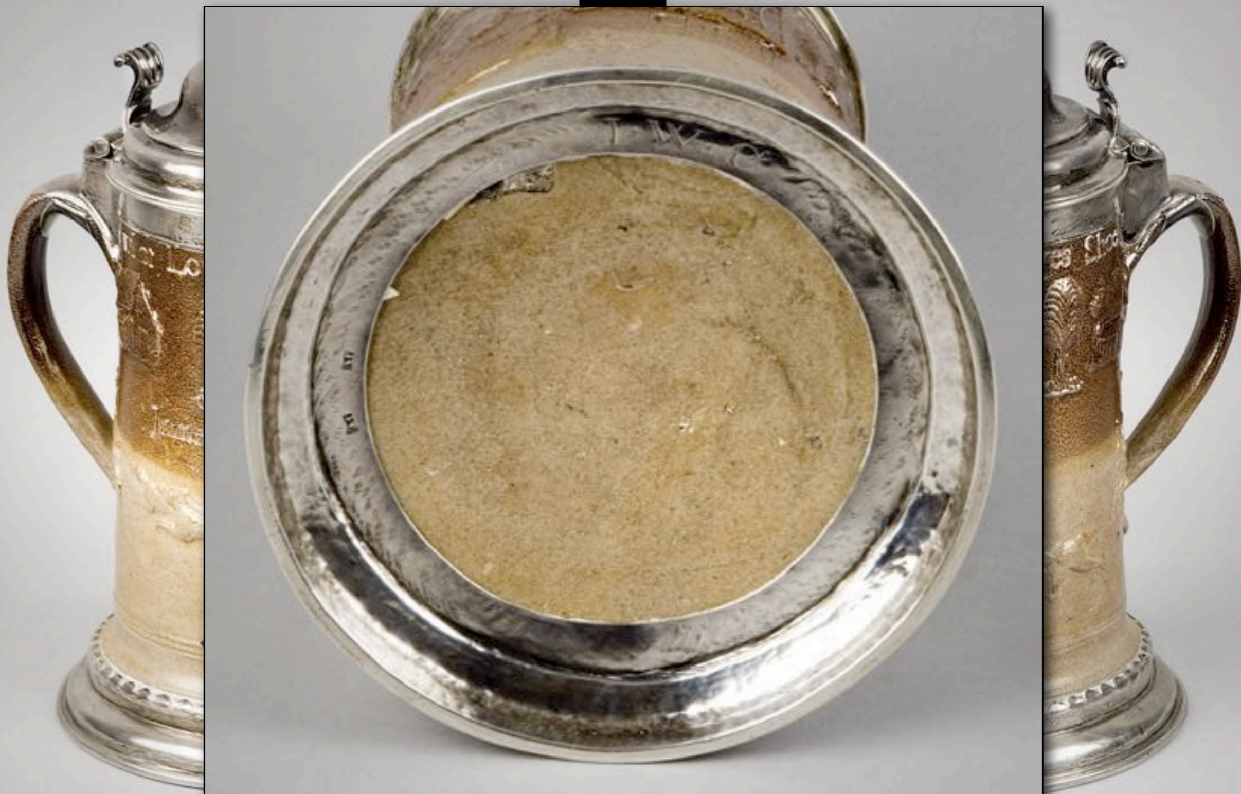
English Salt Glazed Brown Stoneware Tankard with Silver Mounts "See what Love & art can dew by Fiting on a Ladyes Shoe"