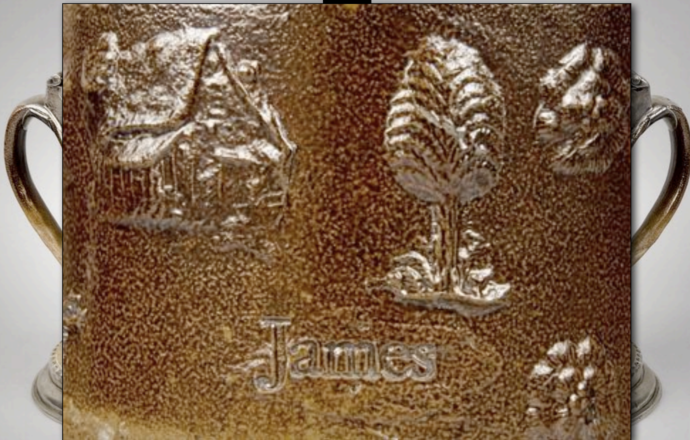
English Salt Glazed Brown Stoneware Tankard with Silver Mounts "See what Love & art can dew by Fiting on a Ladyes Shoe"