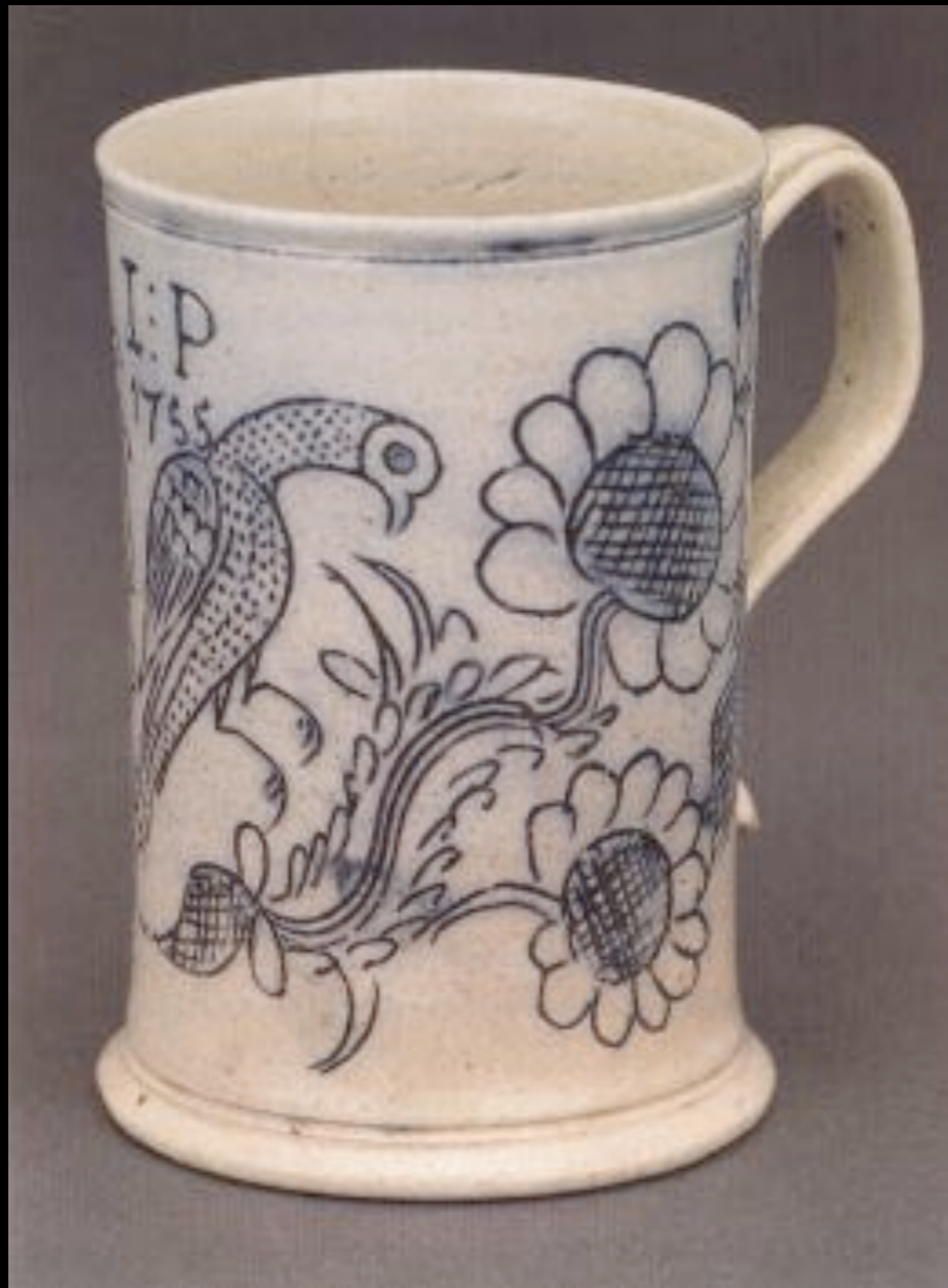
English Staffordshire Scratch Blue Salt Glazed Stoneware Mug