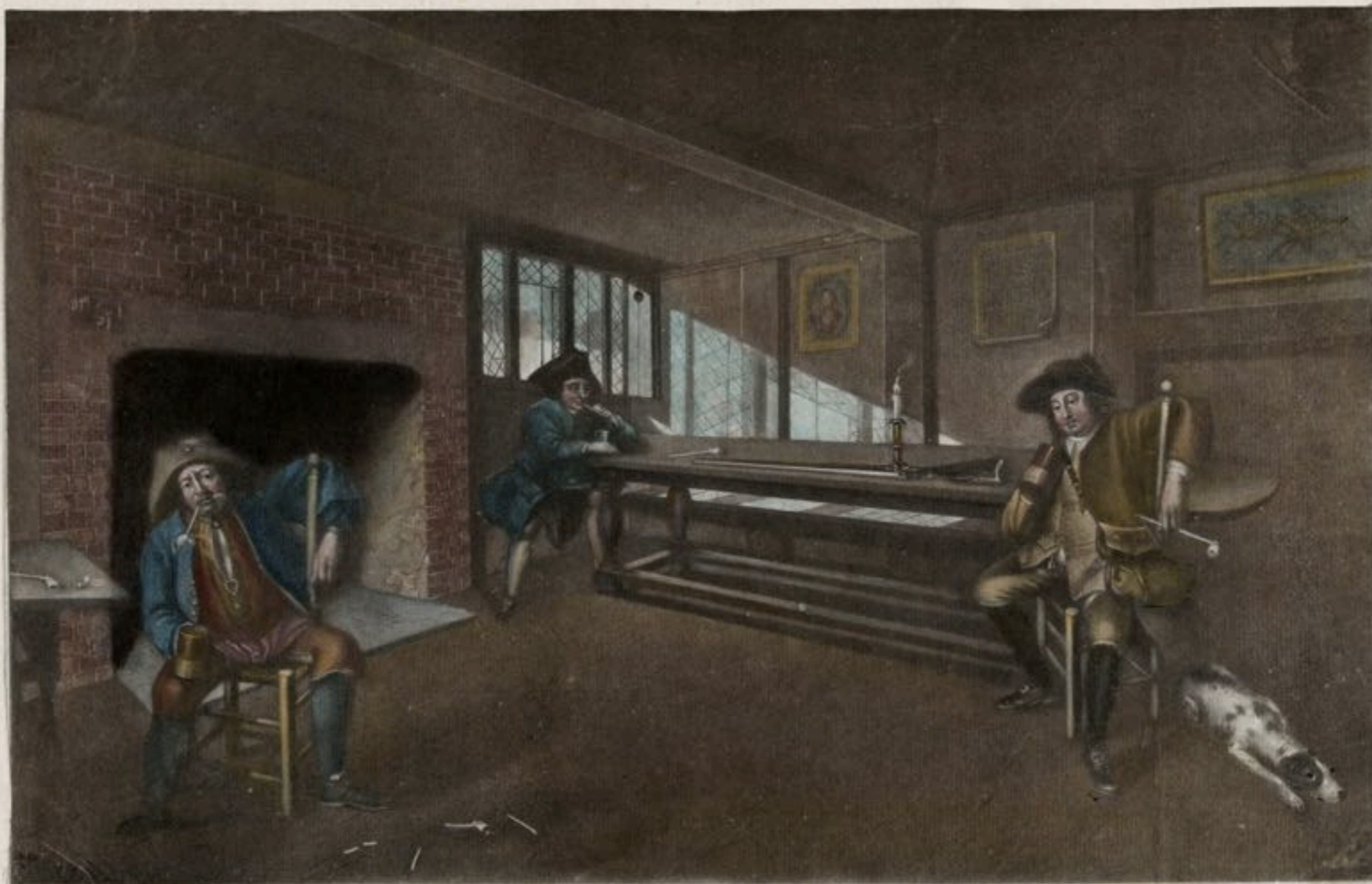
THE SPORTSMAN TAKING REFRESHMENT.

Printed for J. Curwen, at the Black Horse in Strand, London.