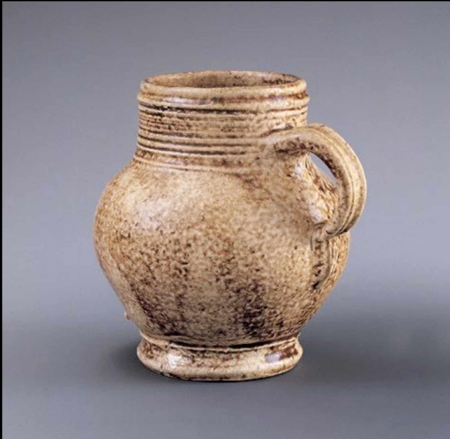
English Salt Glazed Stoneware "Gorge" Mug from Fulham by John Dwight of Fulham c. 1675