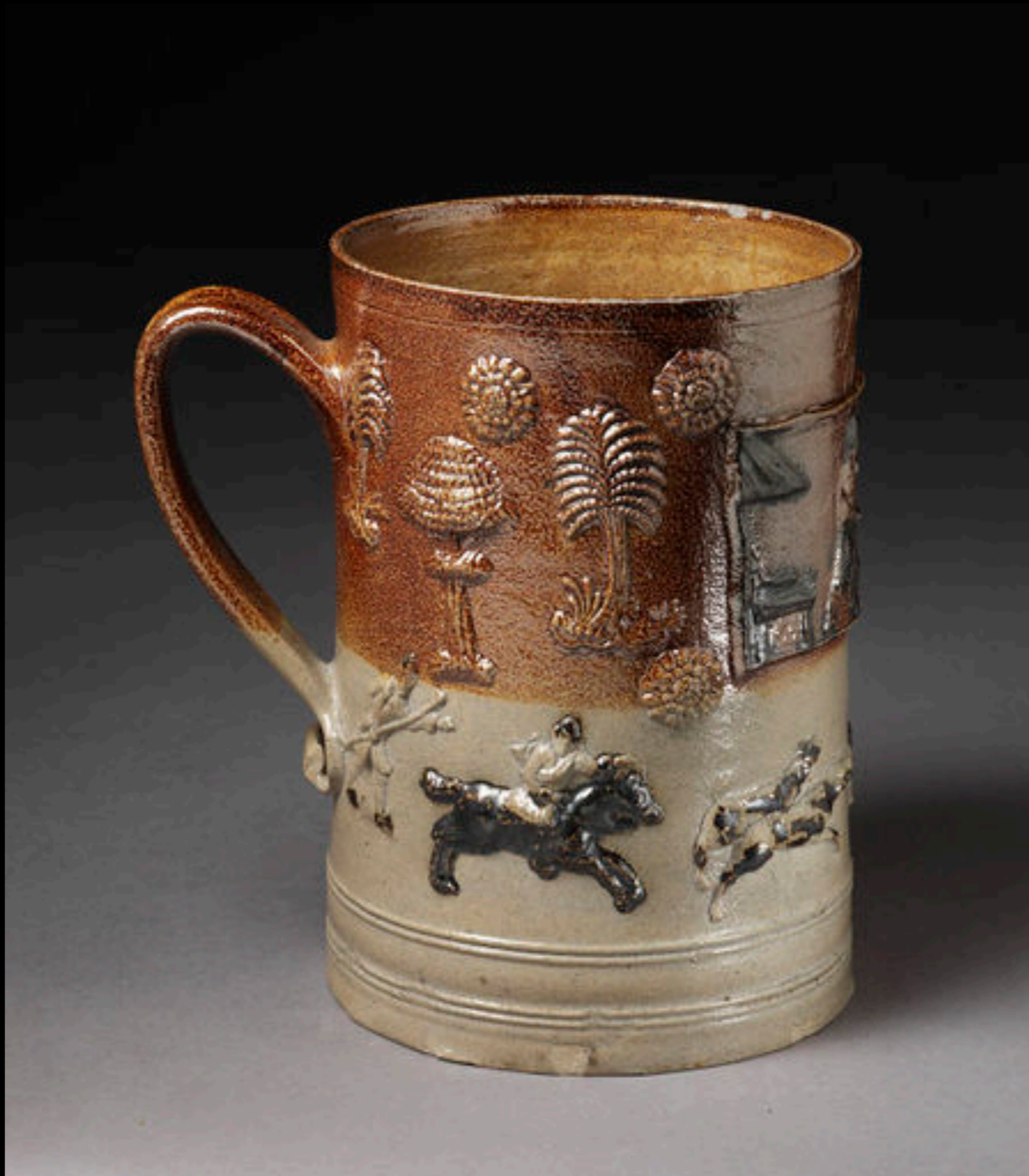
English Salt Glazed Stoneware Mug from London by "Factory B" c. 1729 (Victoria & Albert)