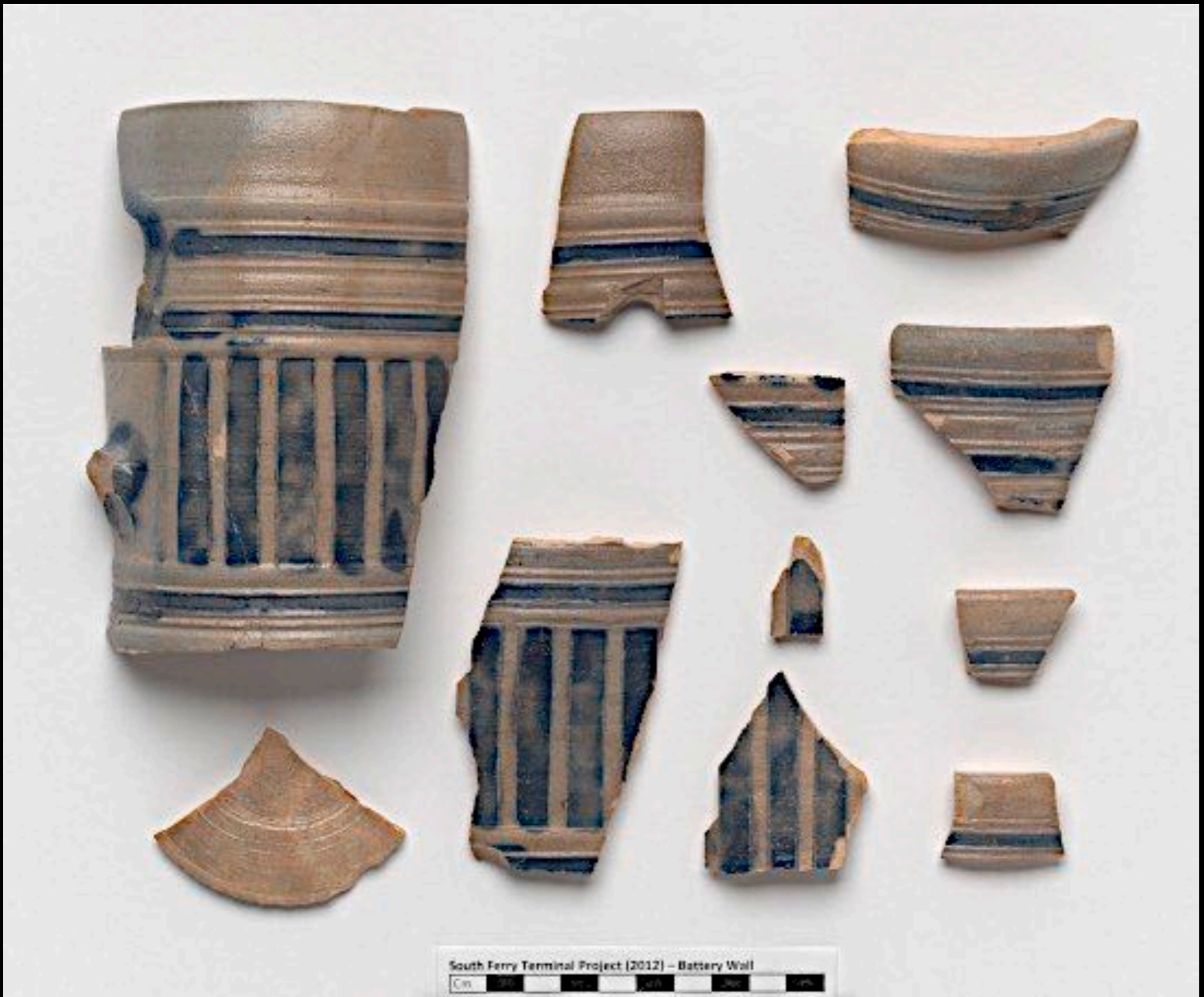
Stoneware Mug Fragments, Possibly American, Recovered from Battery Park, New York Mid 18th Century (Museum of the City of New York)