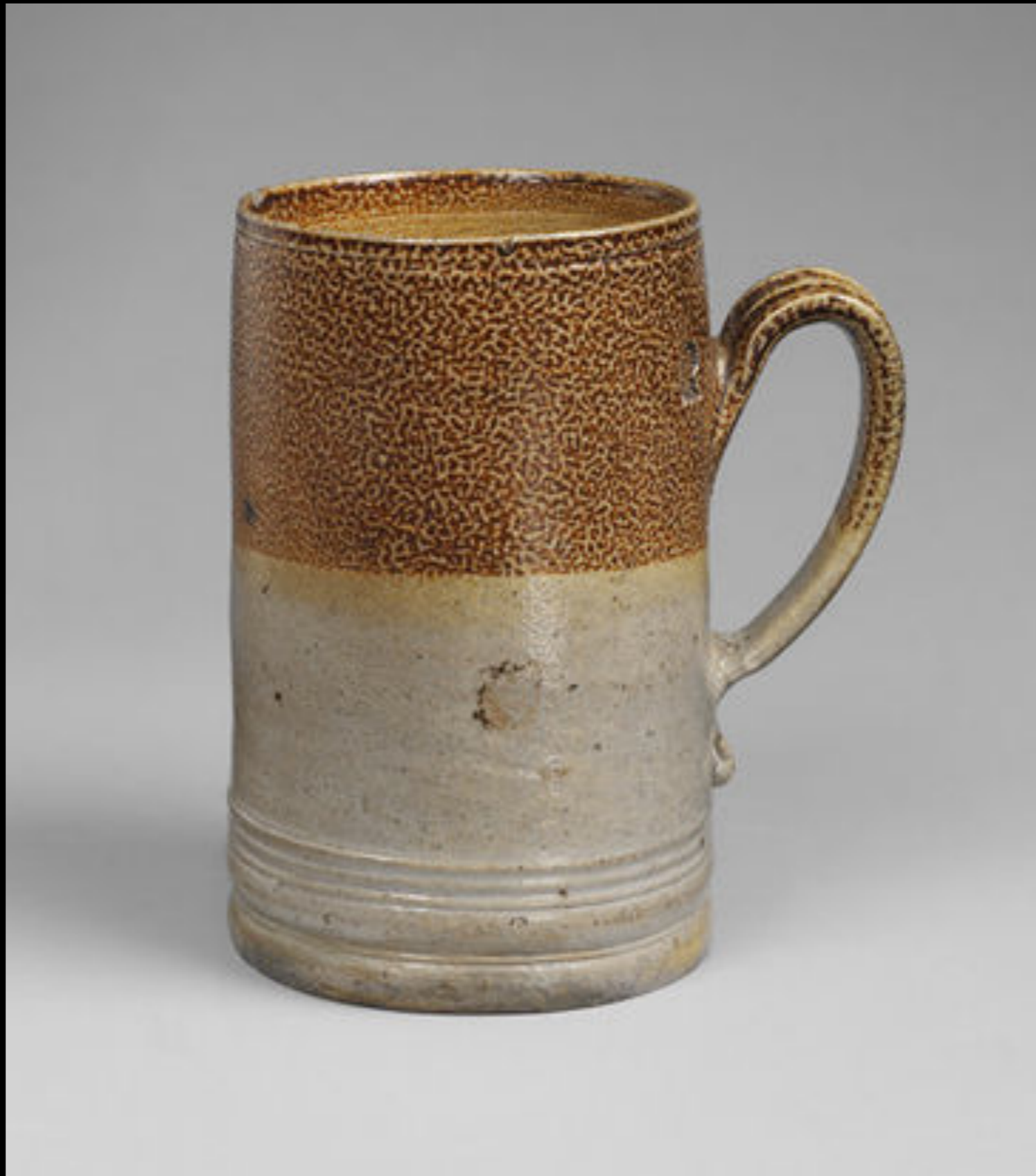
English Salt Glazed Stoneware Mug from London