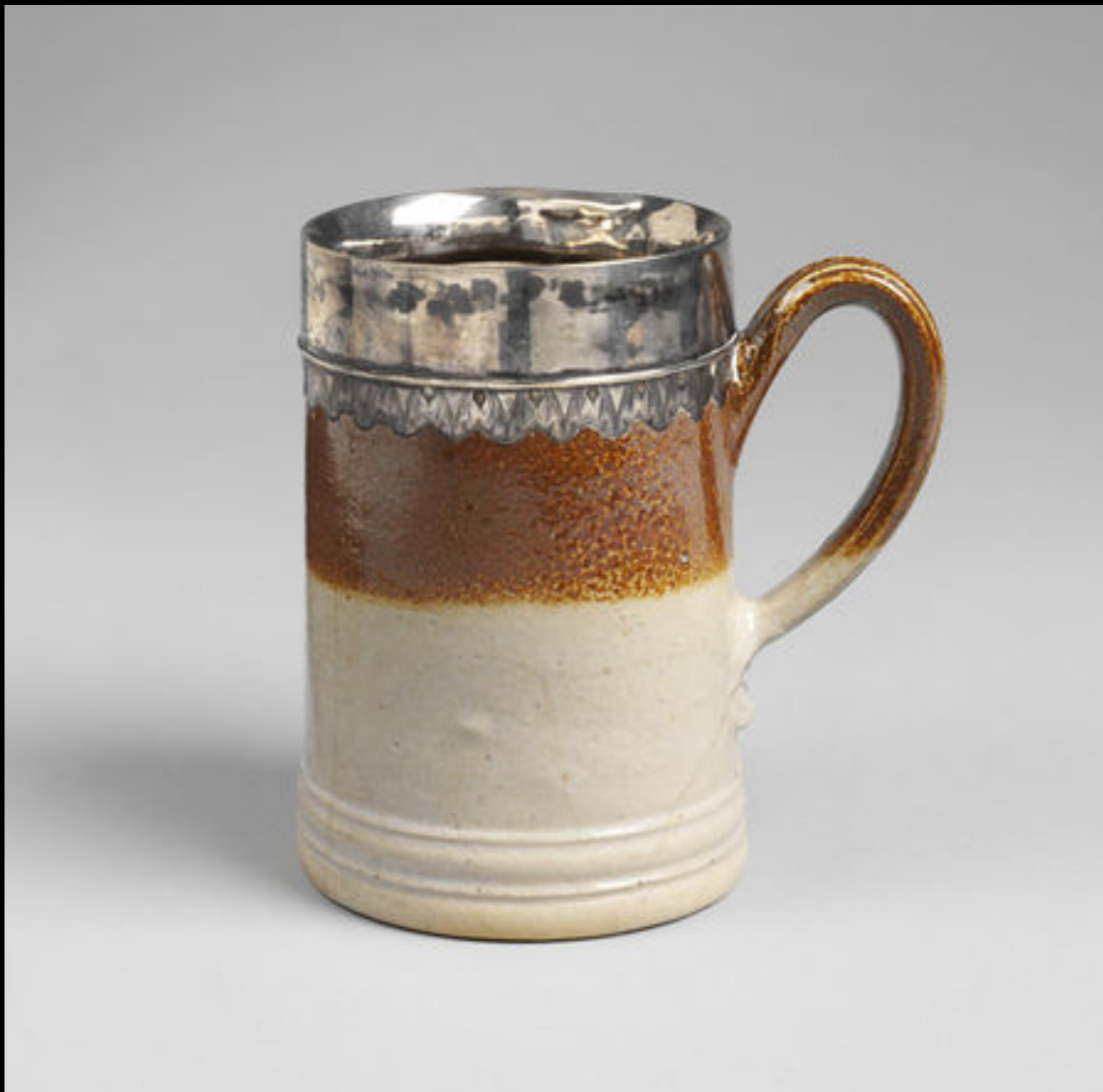
English Salt Glazed Stoneware Mug with a Silver Mount and "AR" Excise Stamp (Queen Anne) from Fulham