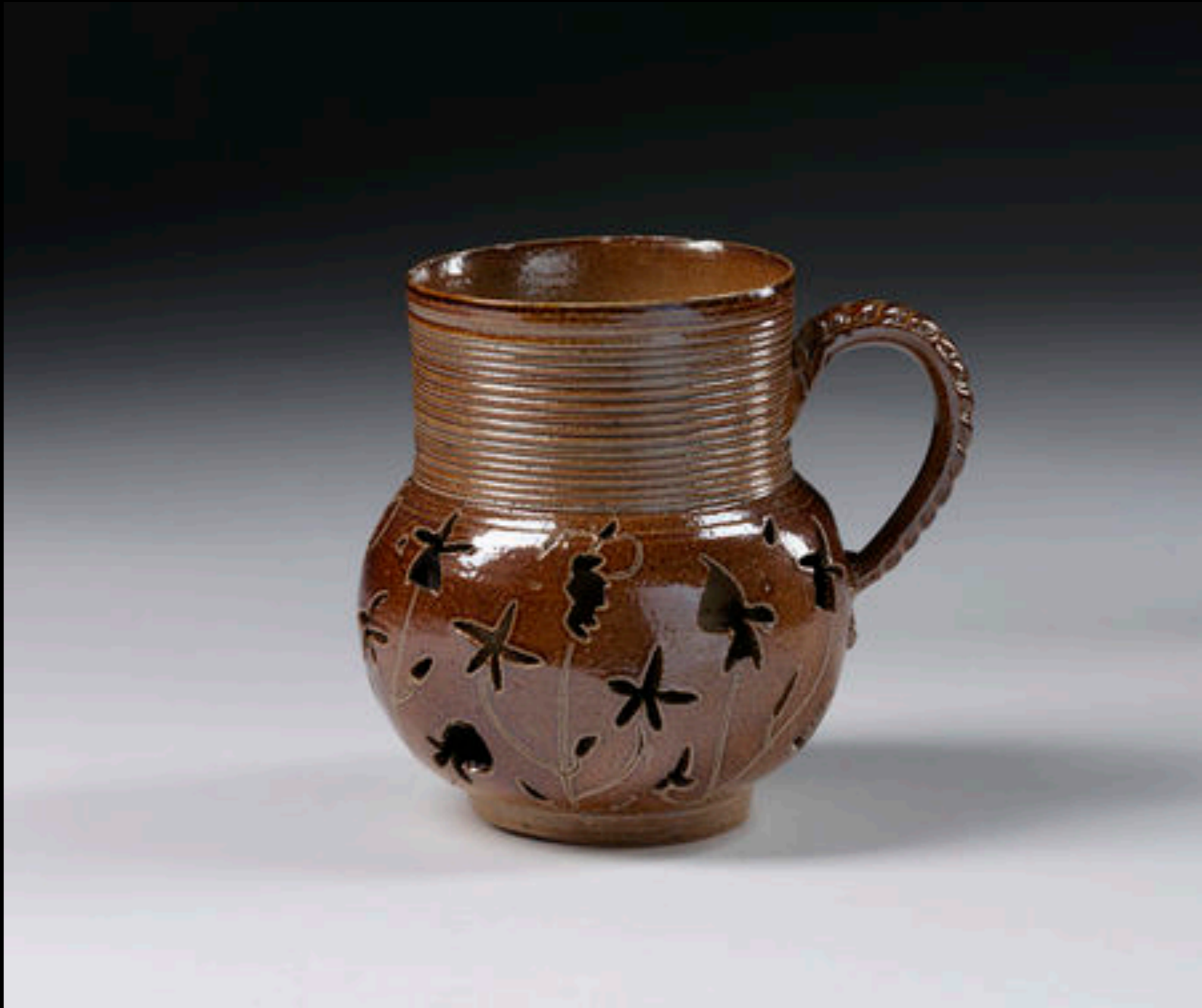
English Salt Glazed Stoneware "Gorge" Mug from Nottingham