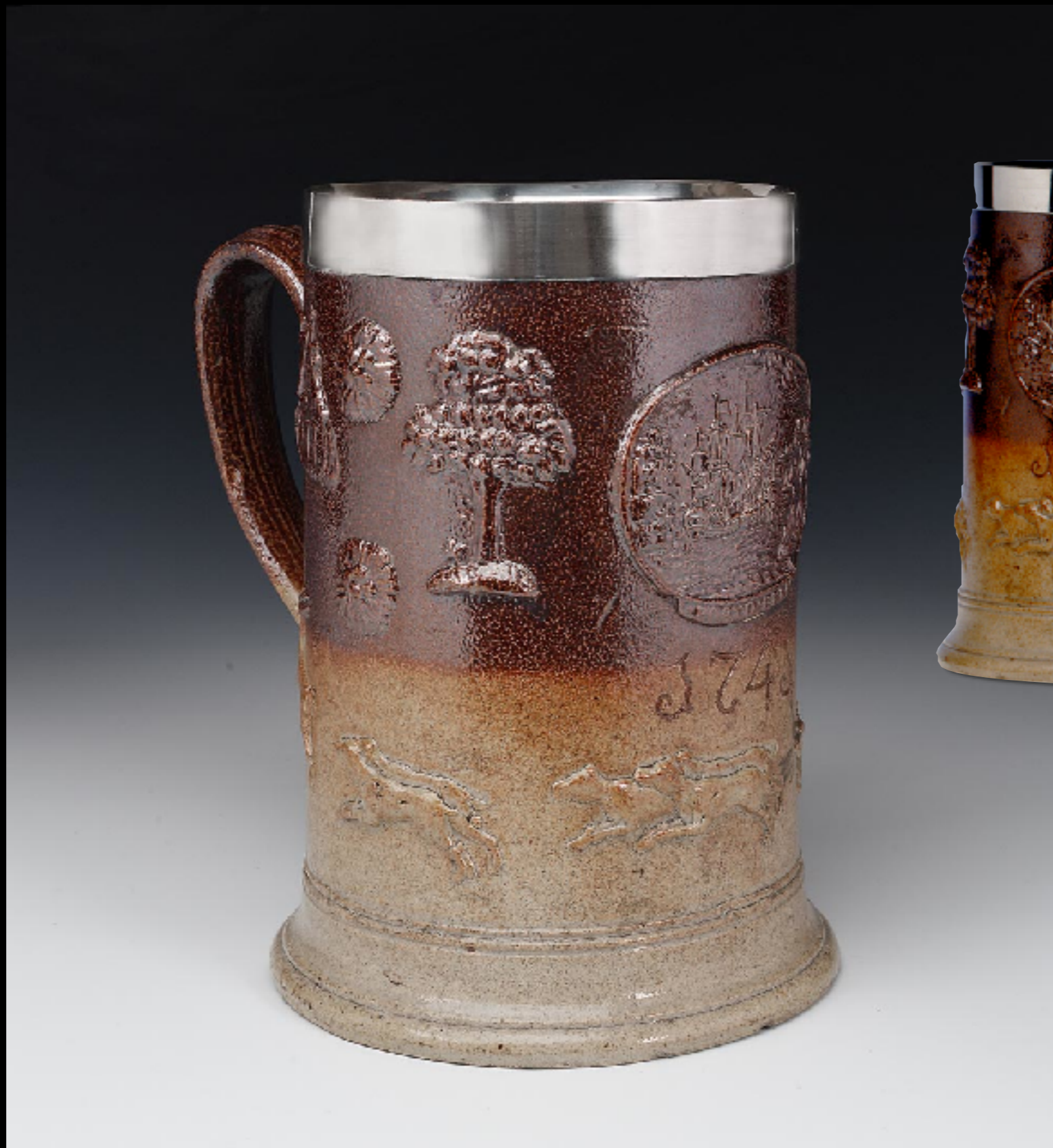
English Fulham Tankard with Reliefs “PORTO BELLO” & Sheffield Plate Rim Commemorating the taking of Porto Bello 1741 (National Maritime Museum)