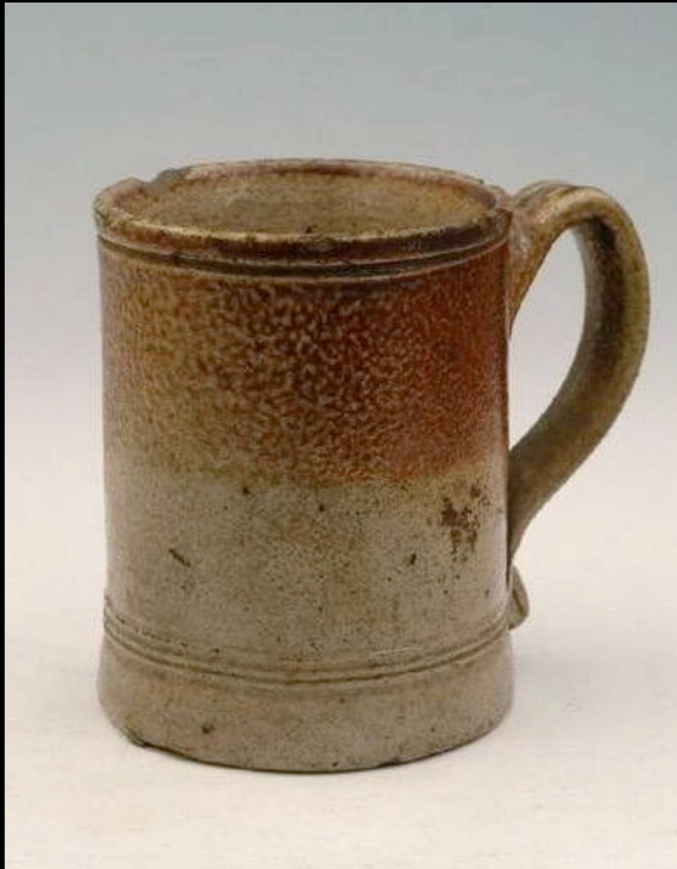
English Stoneware Tankard Stamped with an "AR" Excise Stamp (Queen Anne) from Fulham / Hammersmith