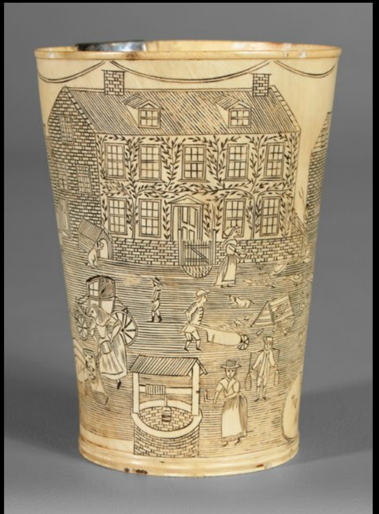
English Horn Cup with Silver Tab Engraved "B" and Dated 1768 1768