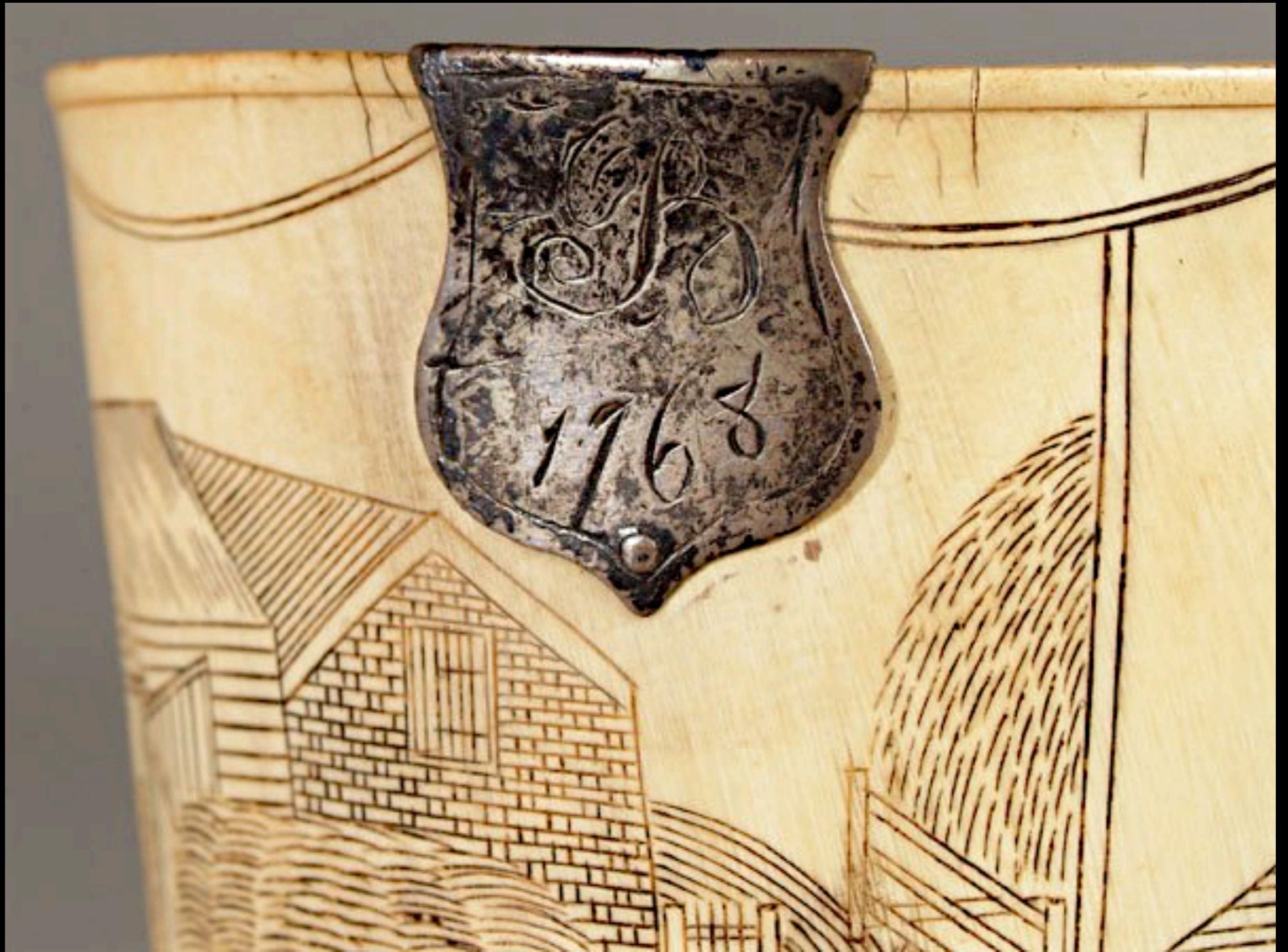
English Horn Cup with Silver Tab Engraved "B" and Dated 1768 1768