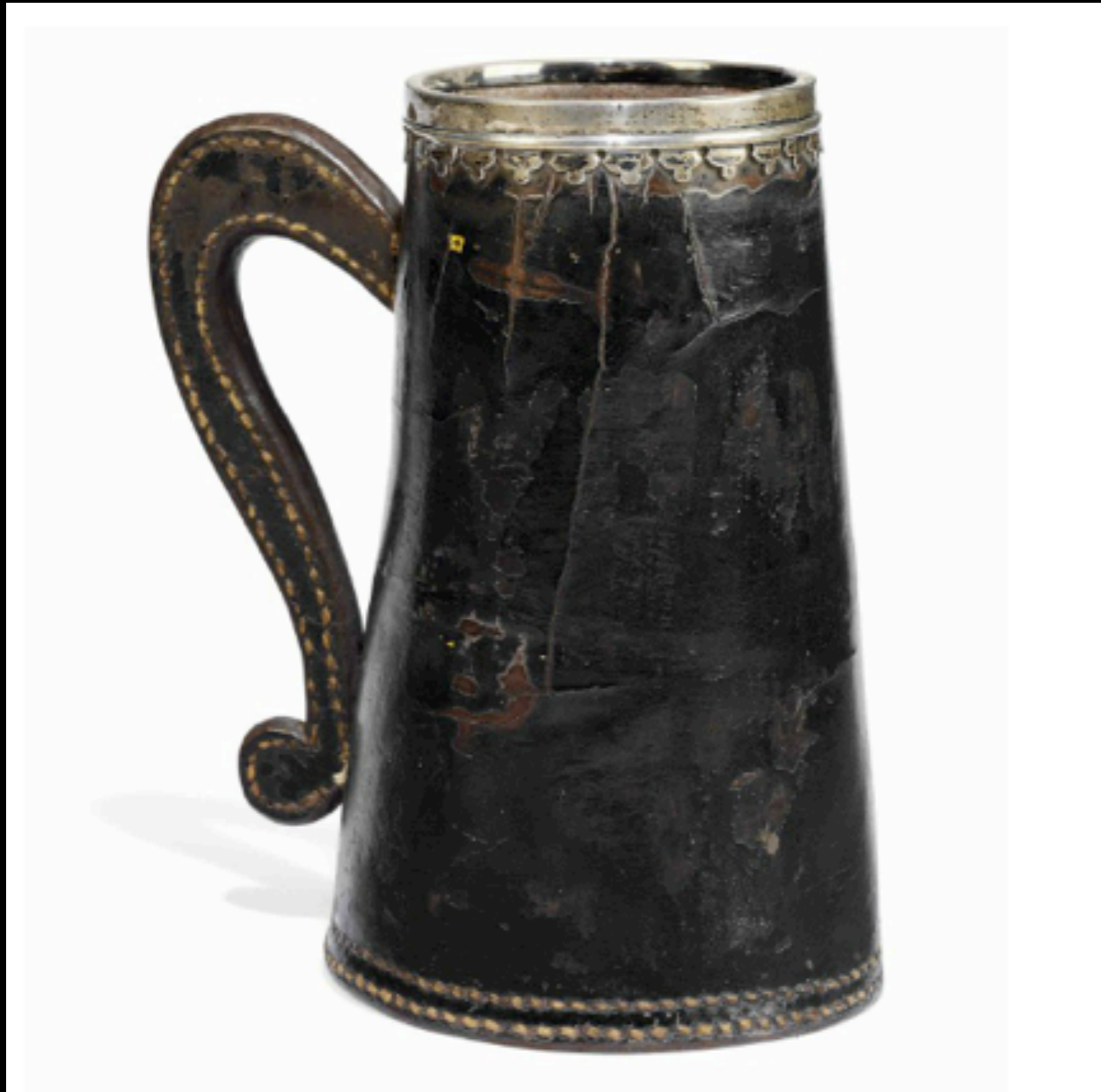
Silver Mounted Leather Black Jack Mug Late 18th Century (Christies' Auctions)