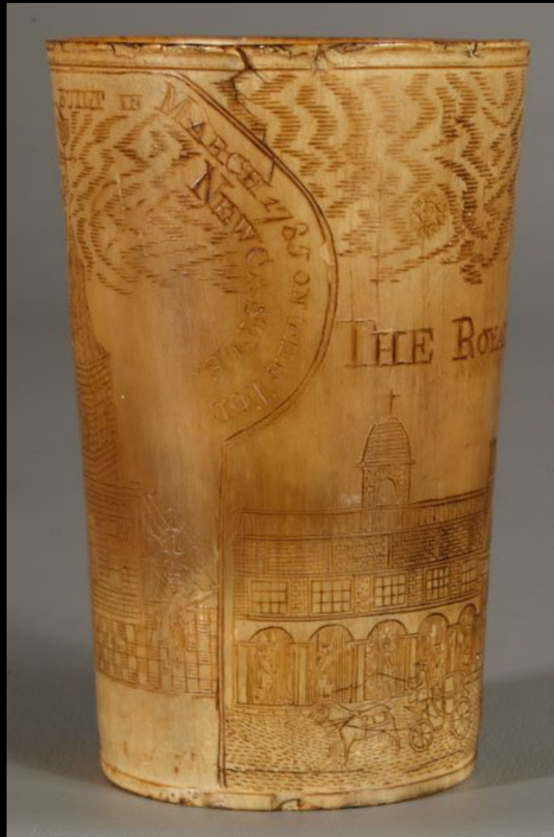
English Horn Cup Engraved with "The Royal Exchange" 1785 (Brunk Auctions)