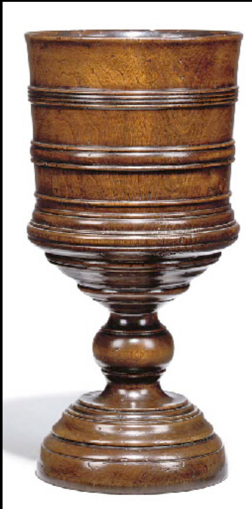
English Walnut Loving Cup c. 1670 (Christie's)