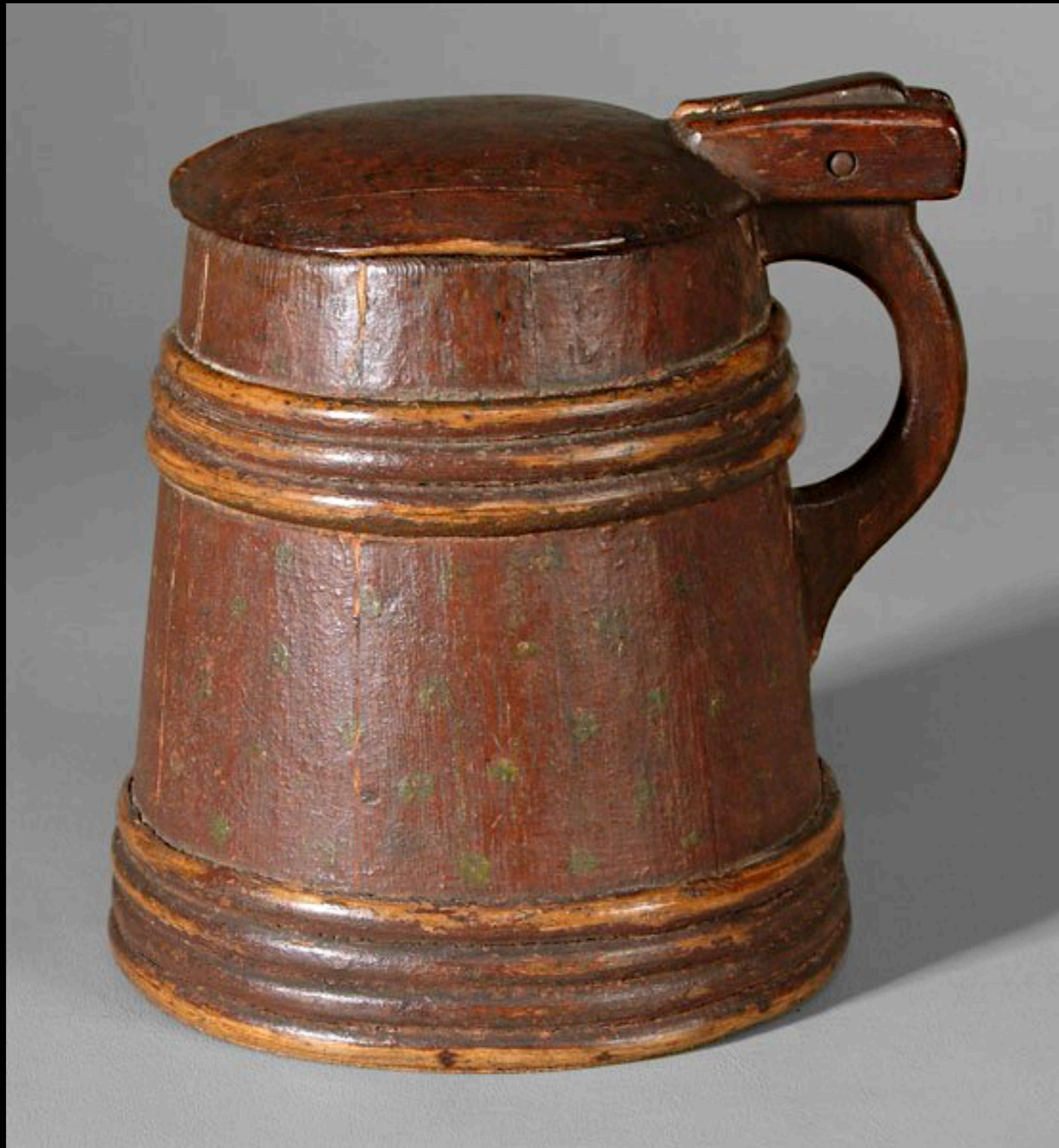
English Staved Wood Tankard with Lid Late 18th to Early 19th Century (Brunk Auctions)