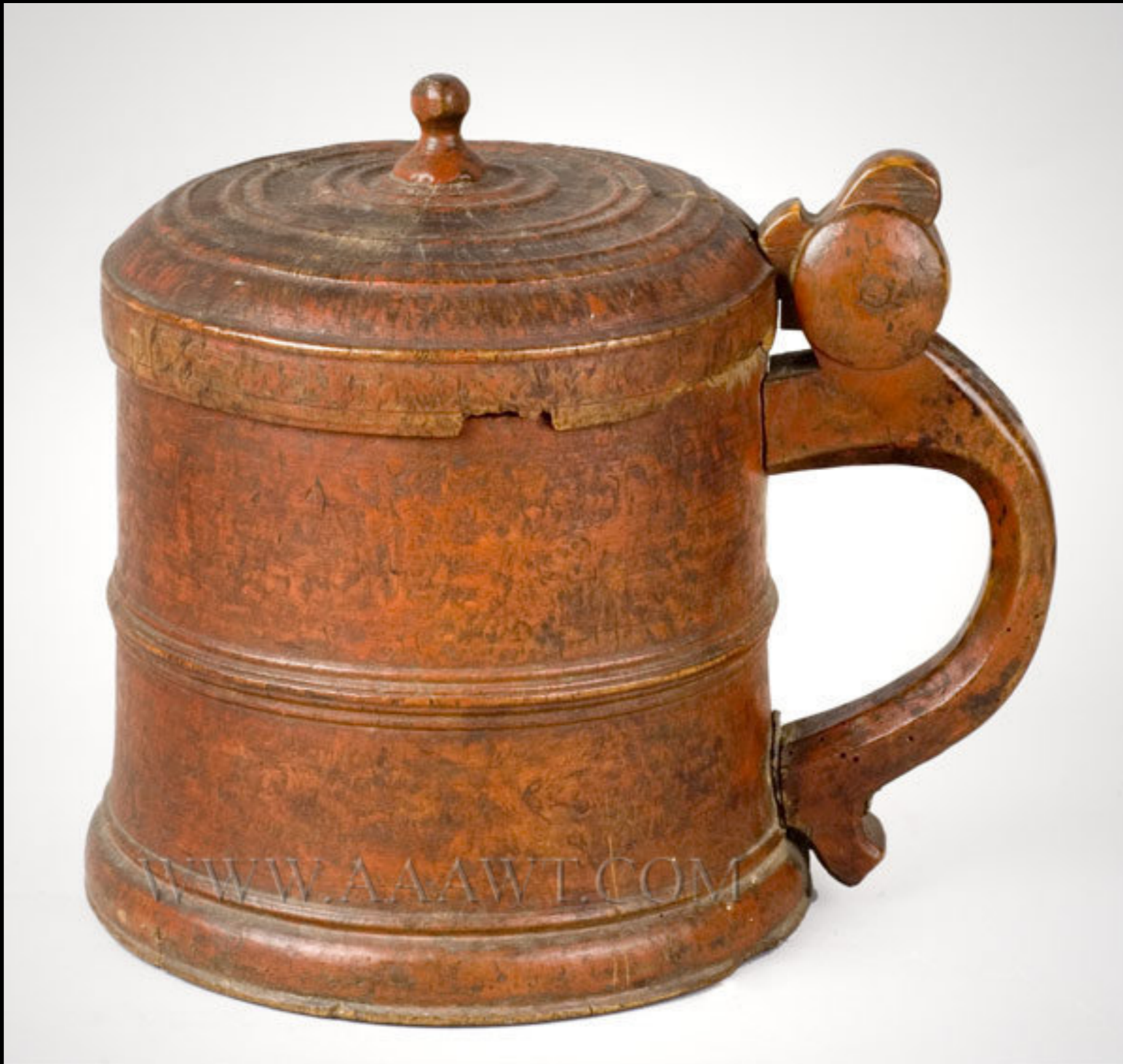
Burl Wood Engine Turned Tankard with Lid in Red Paint