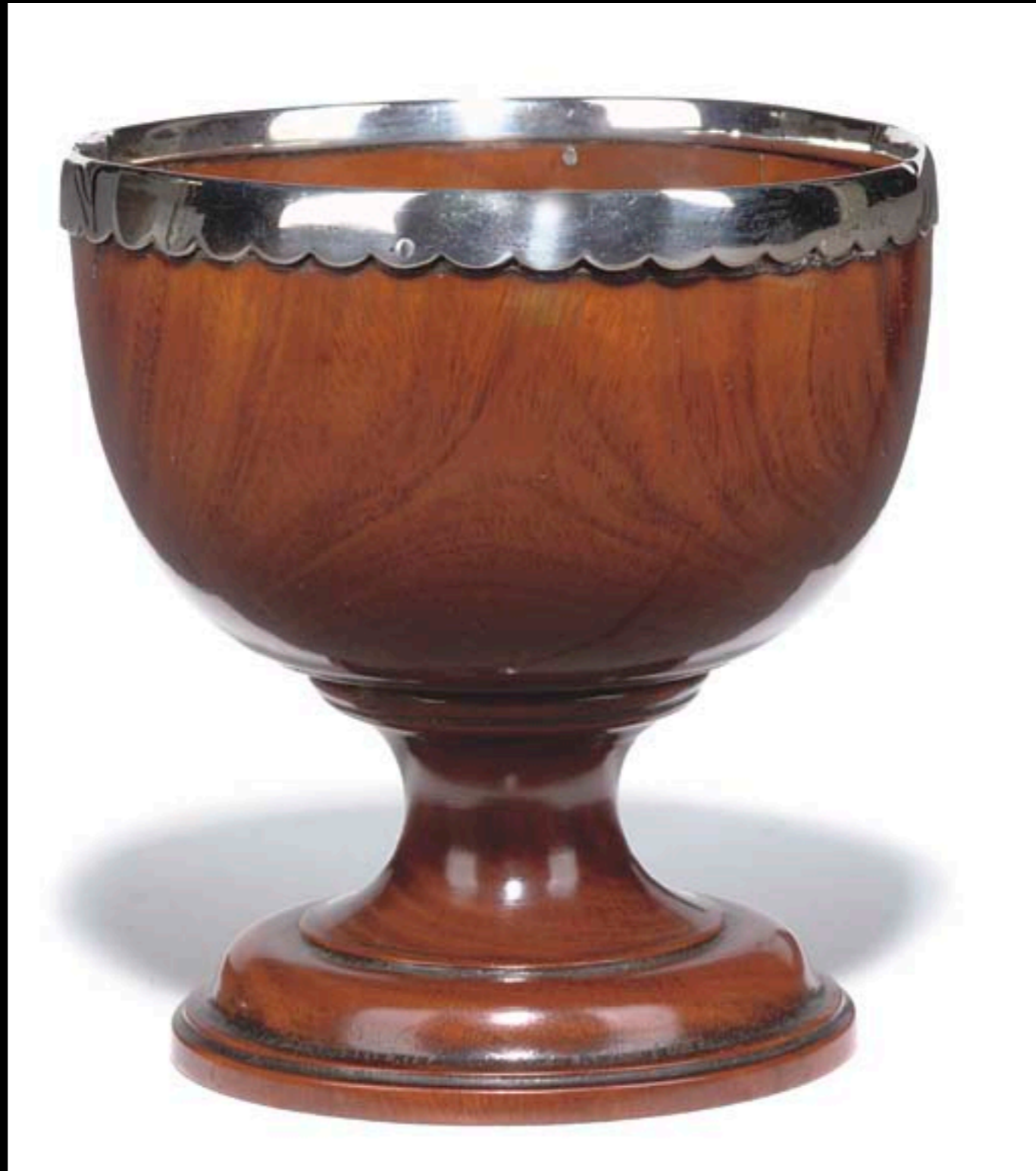
English Silver Mounted Lignum Vitae Goblet