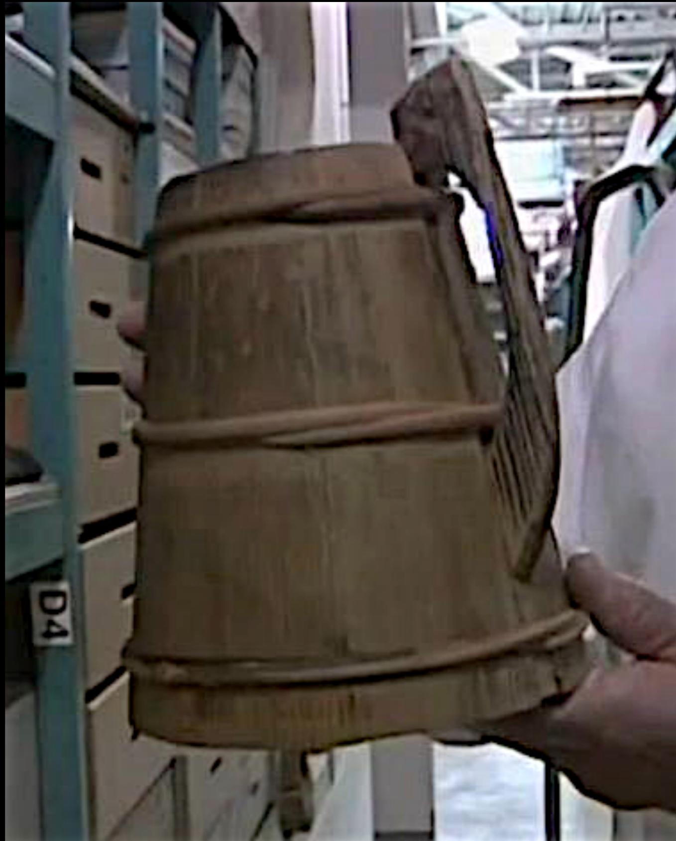
8" Tall Wood Tankard Recovered from the Wreck of the Privateer "Defense" Sunk in the Penobscot Expedition of 1779