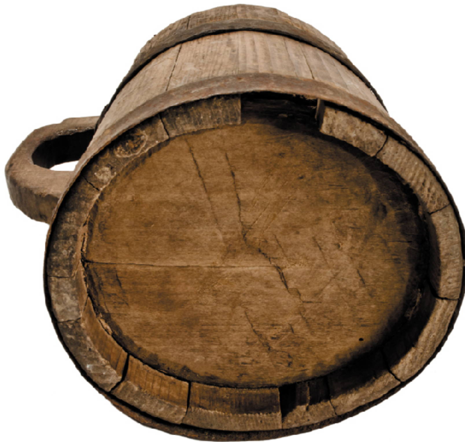
Staved Wood Tankard with Lid & Iron Hoops 18th Century