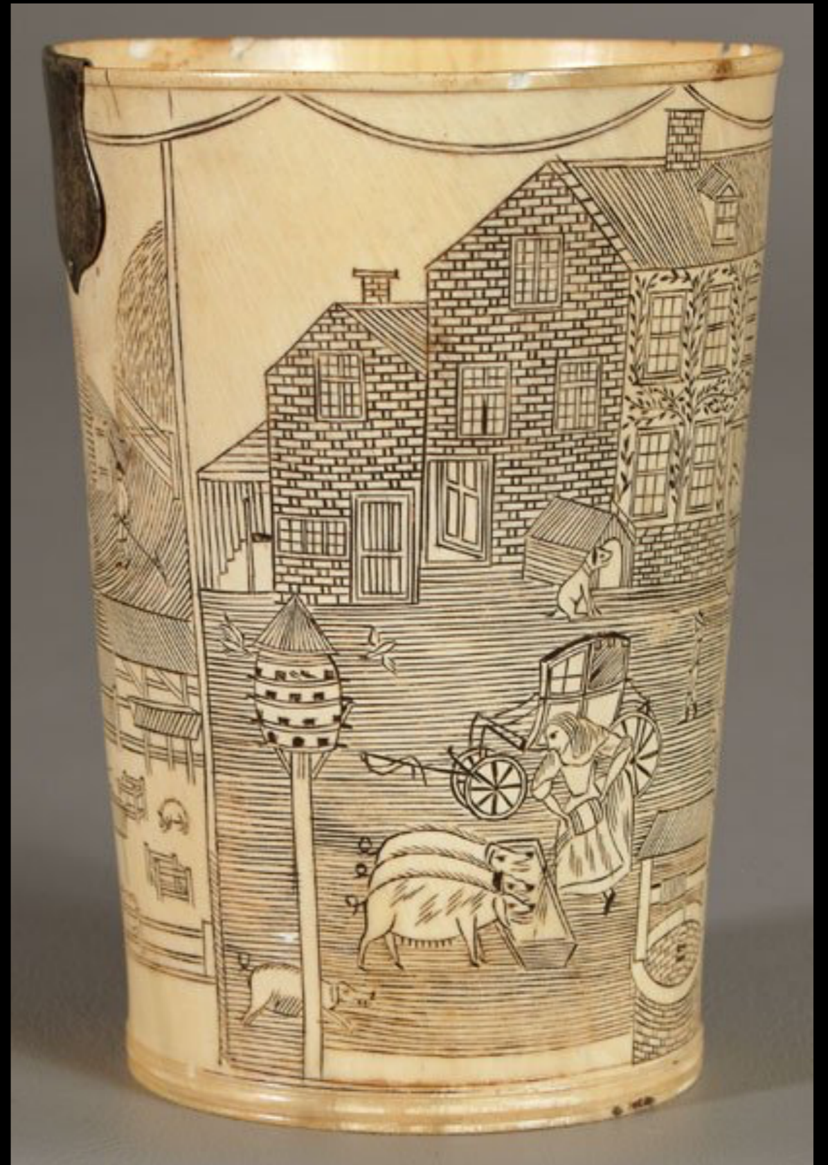
English Horn Cup with Silver Tab Engraved "B" and Dated 1768 1768