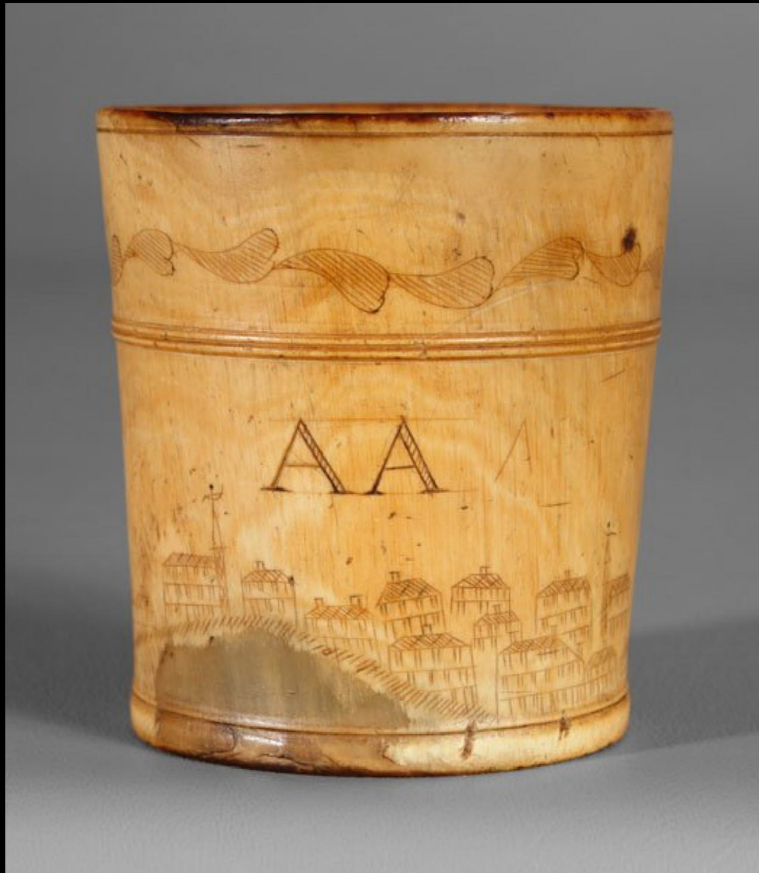
English Horn Cup Engraved with "AA" Late 18th - Early 19th Century