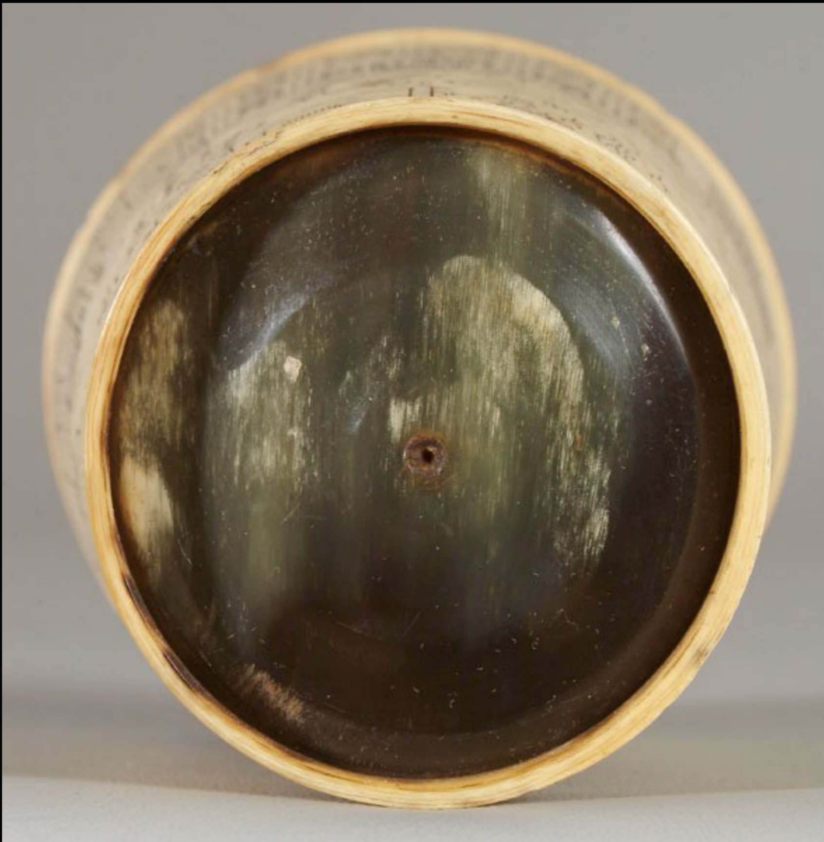
English Horn Cup with Silver Tab Engraved "B" and Dated 1768 1768