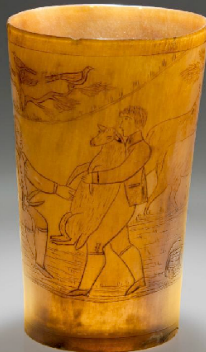
American Horn Cup Late 18th Century (Colonial Williamsburg)