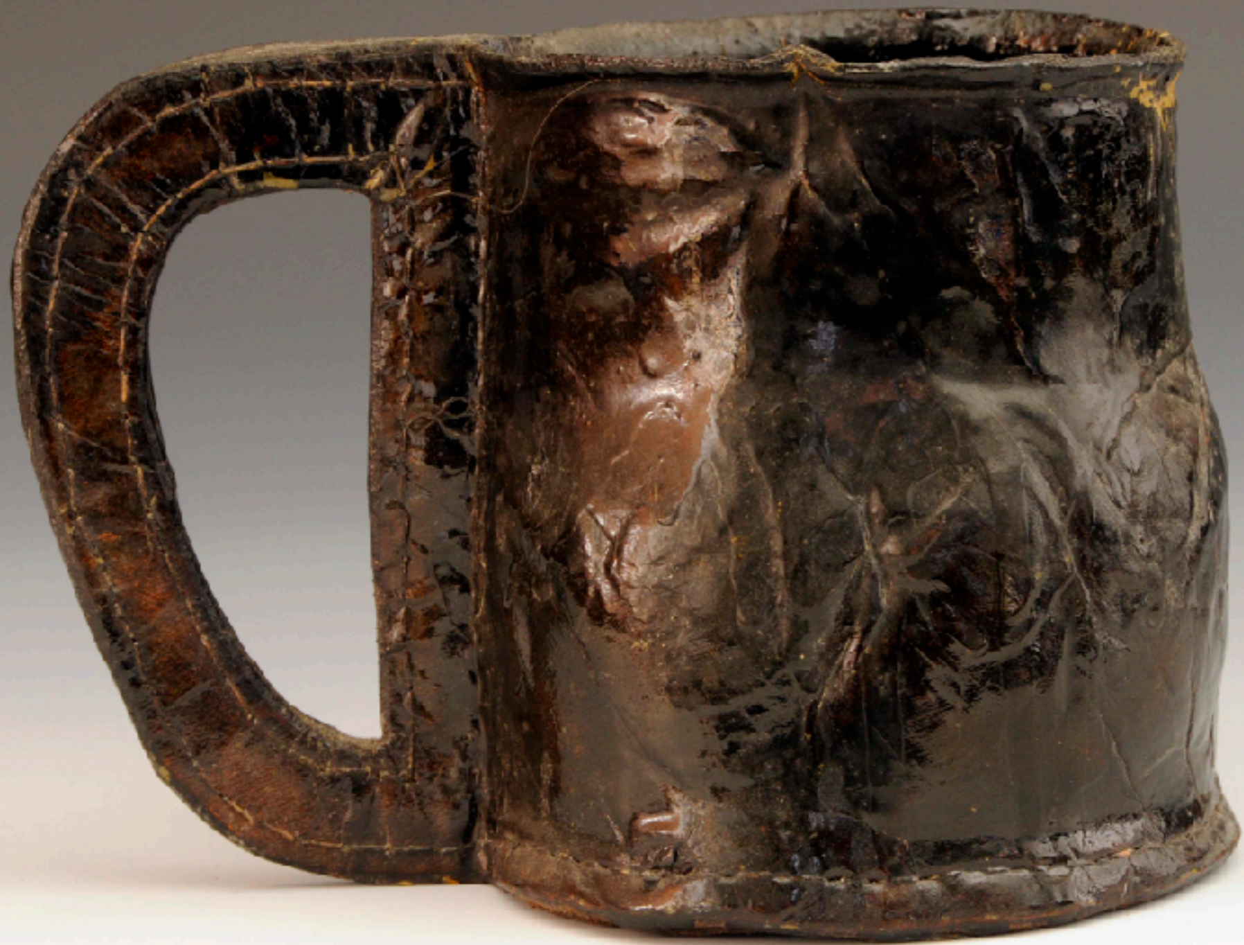
Leather Black Jack Mug Late 17th - 18th Century (Bamford Auctioneers)