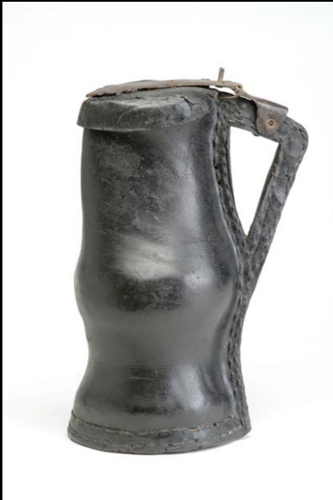
Leather Black Jack Mug 18th Century (Private Collection)