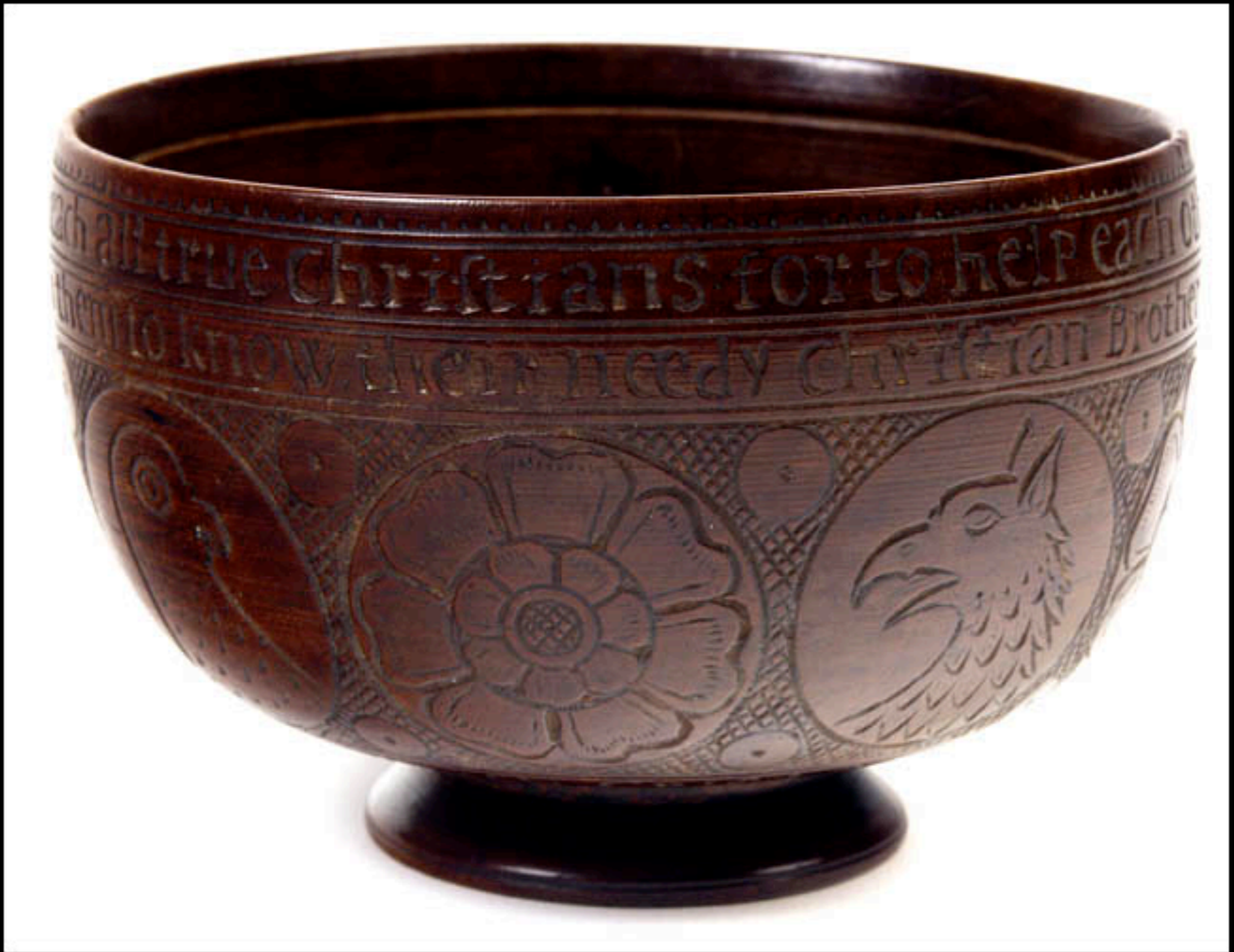
English Walnut Cup Owned by the Allerton-Cushman Family of Plymouth, Massachusetts