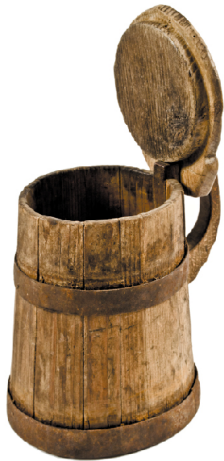
Staved Wood Tankard with Lid & Iron Hoops 18th Century