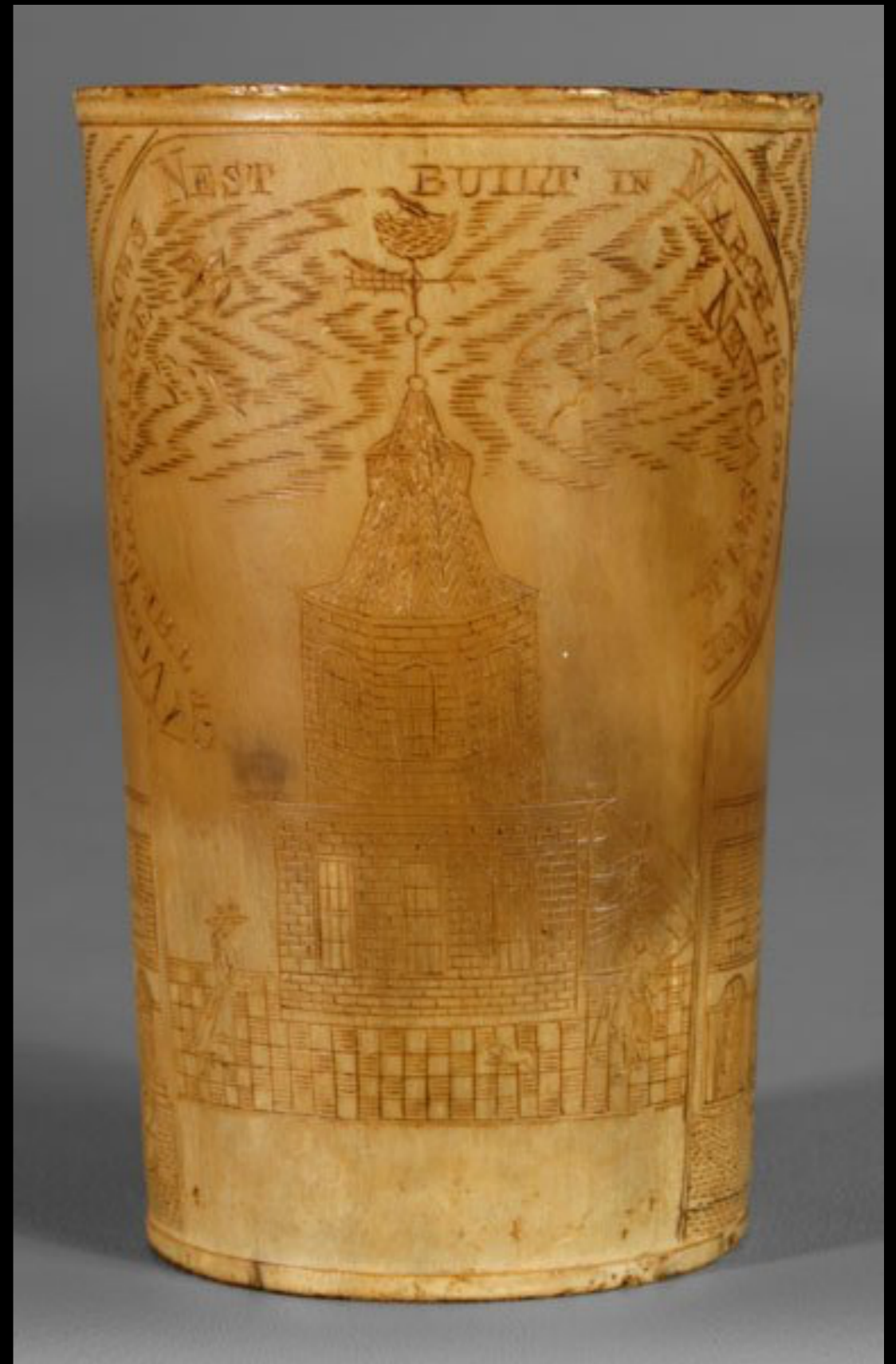
English Horn Cup Engraved with "The Royal Exchange" 1785 (Brunk Auctions)