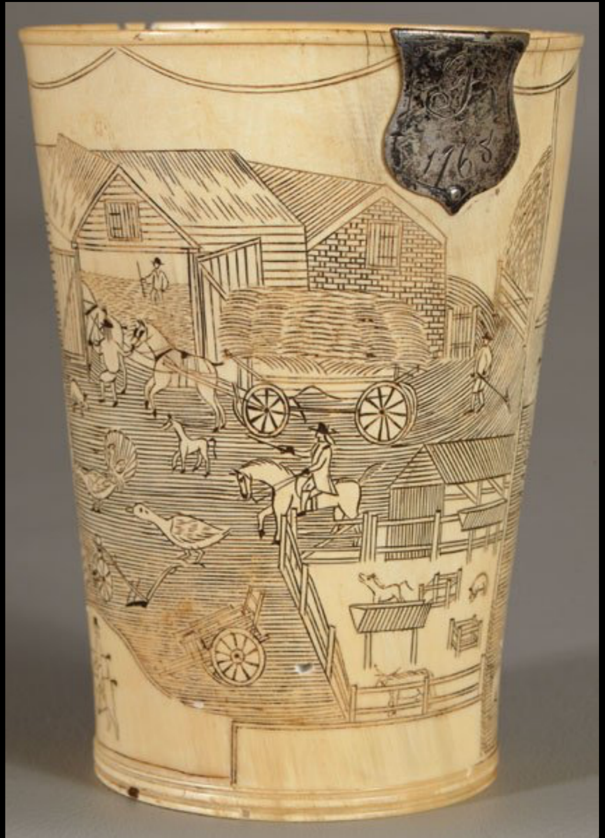
English Horn Cup with Silver Tab Engraved "B" and Dated 1768 1768