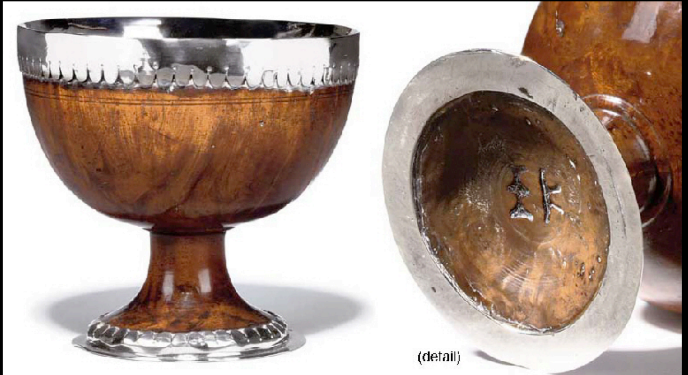
English Silver Root Burr Maple Mounted Mazer Goblet c. 1600