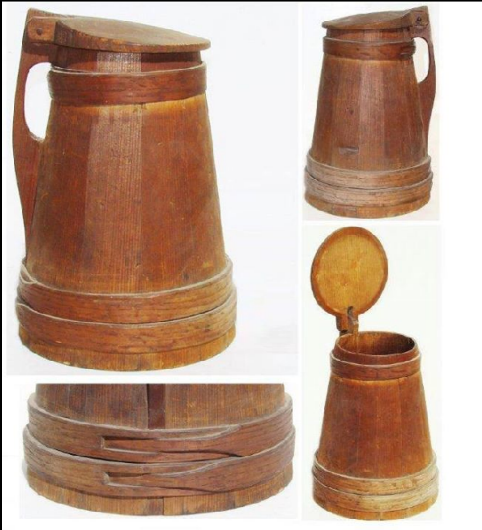
Staved Wood Tankard with Lid & Wood Hoops 18th Century (Gould Auctions)