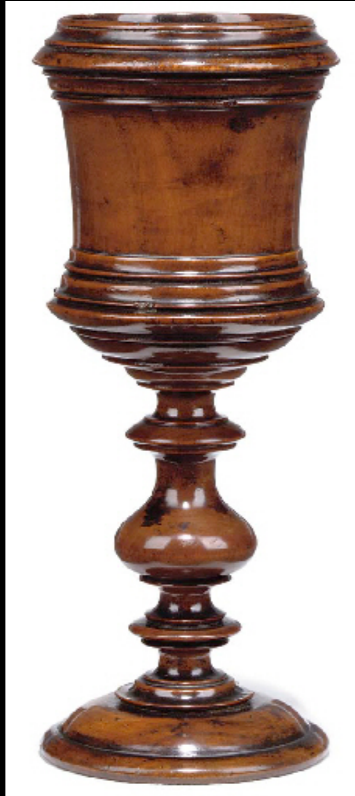
English Walnut Standing Cup c. 1700 (Christie's)