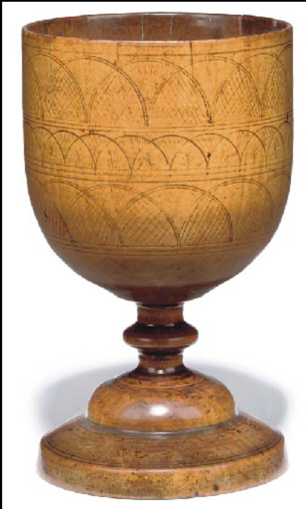
English Pearwood Cup c. 1620 (Christie's)