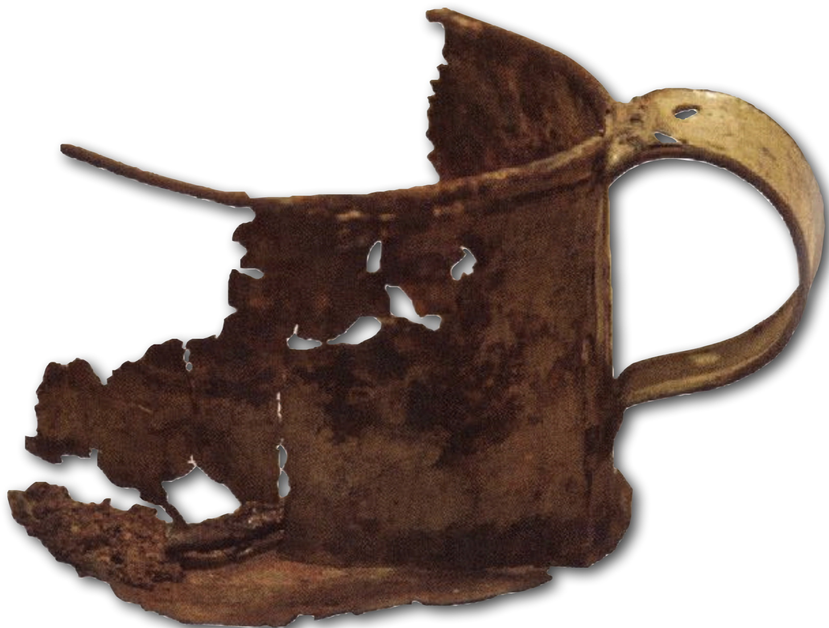
Tin Cup Excavated from Fort Ligonier From "A Soldier-Like Way" by R.R. Gale c. 1758 (Fort Ligonier Collection)