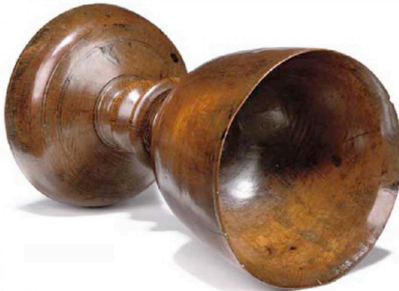
English Yew Wood Goblet c. 1640 (Christie's)