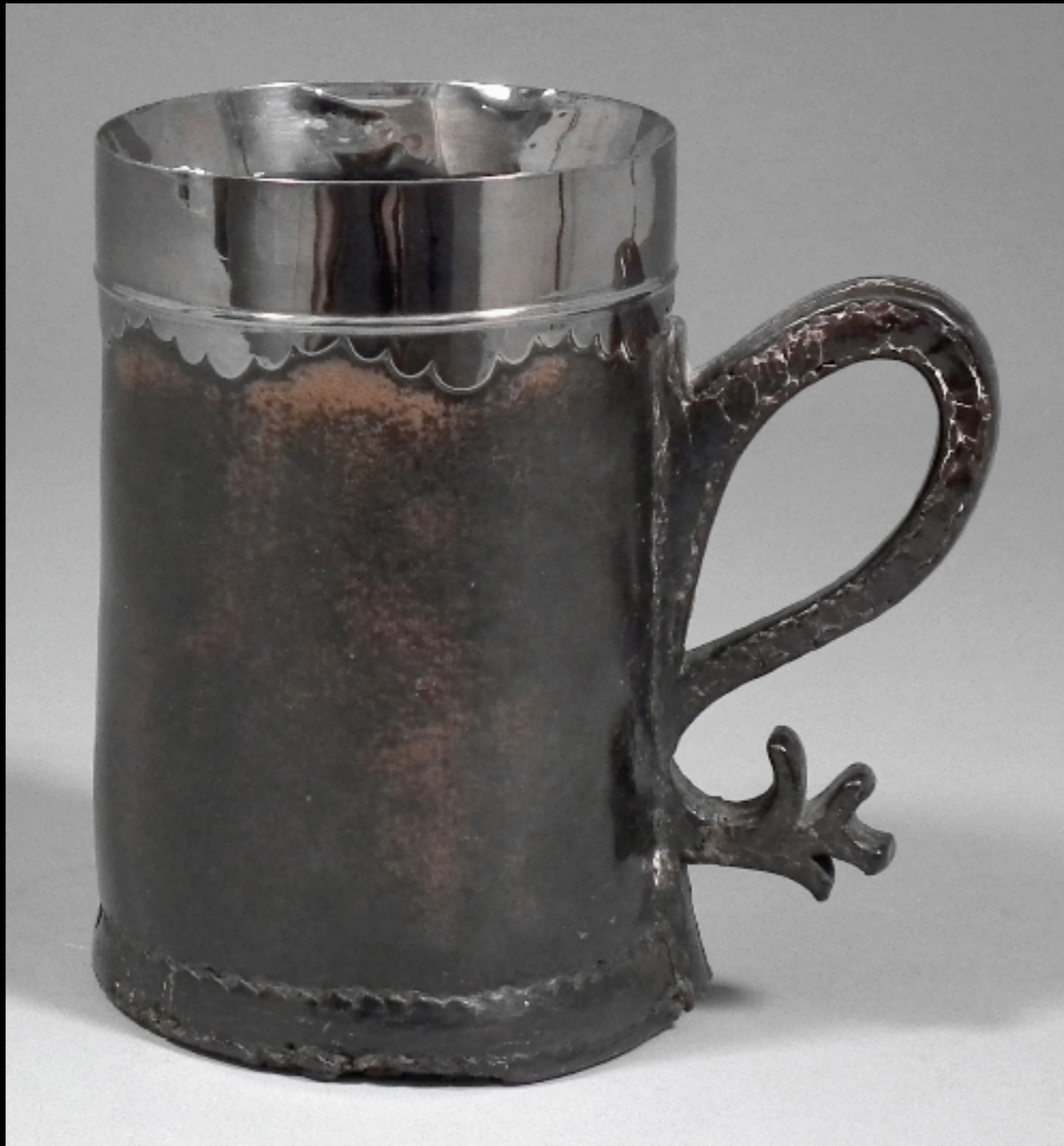
English Silver - Mounted Leather Black Jack Tankard 18th Century (Canterbury Auction House)