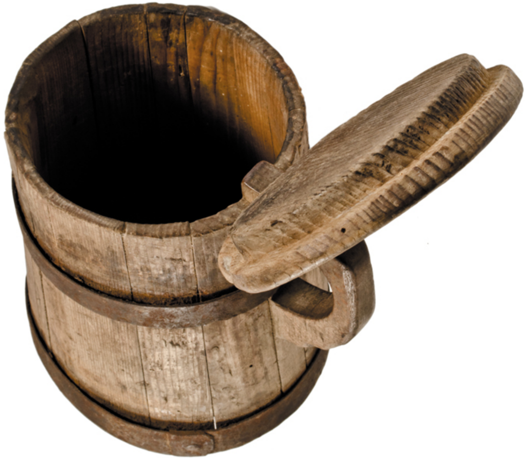
Staved Wood Tankard with Lid & Iron Hoops 18th Century