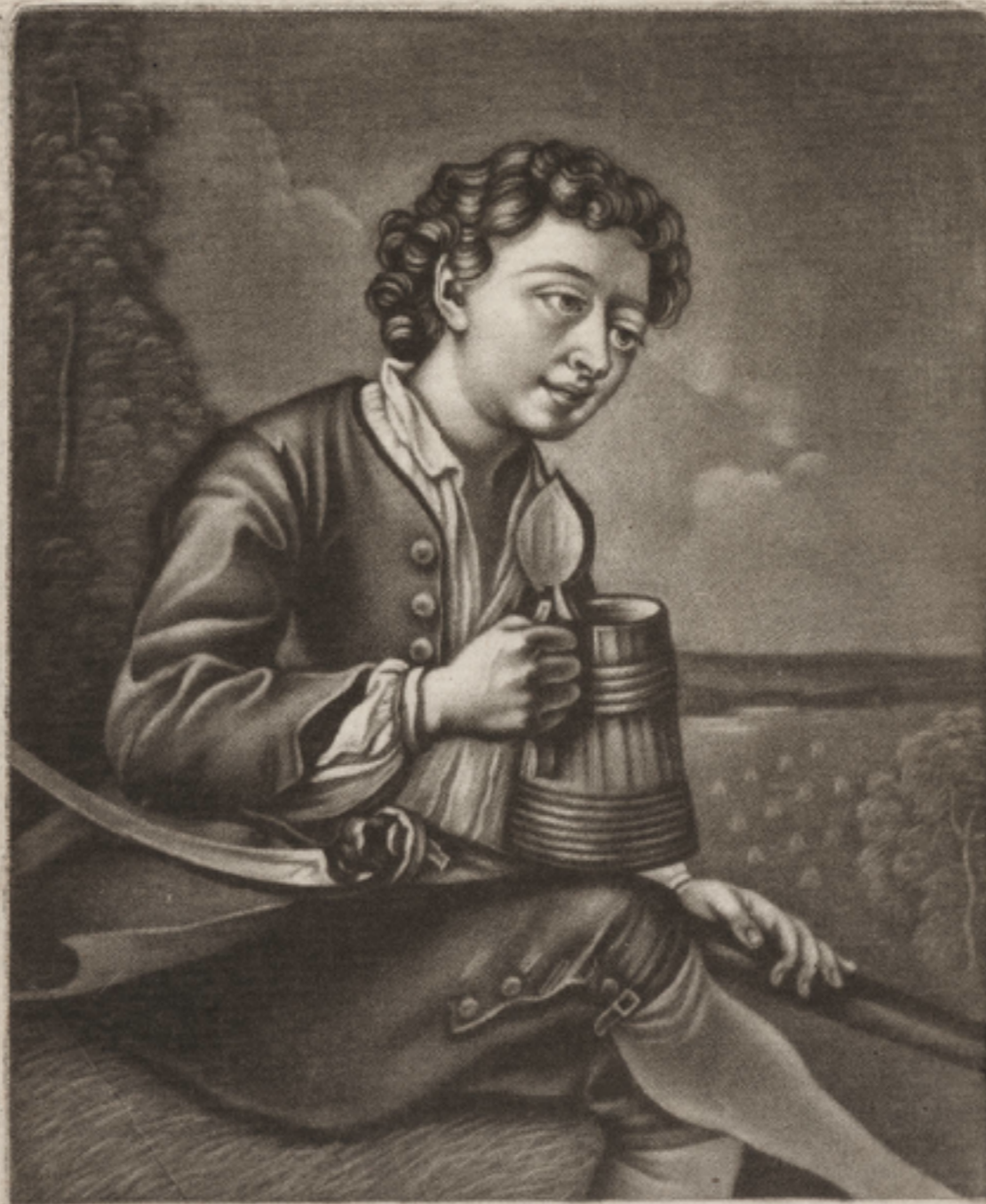
THE SCYTHER, MAN'S REFRESHMENT. Printed for Carington Bowles, in St. Pauls Church Yard, London.