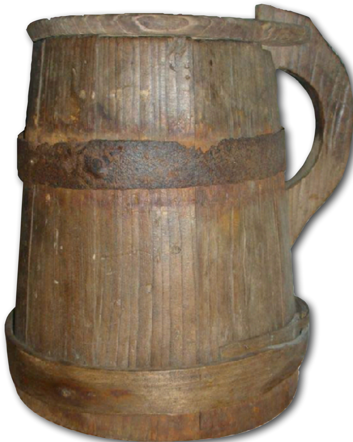
Staved Wood Tankard with Lid & Hoops of Iron & Wood 18th Century (Ruby Lane)