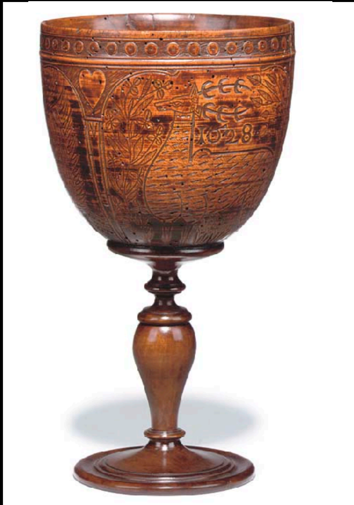
English Pearwood Cup c. 1620 (Christie's)