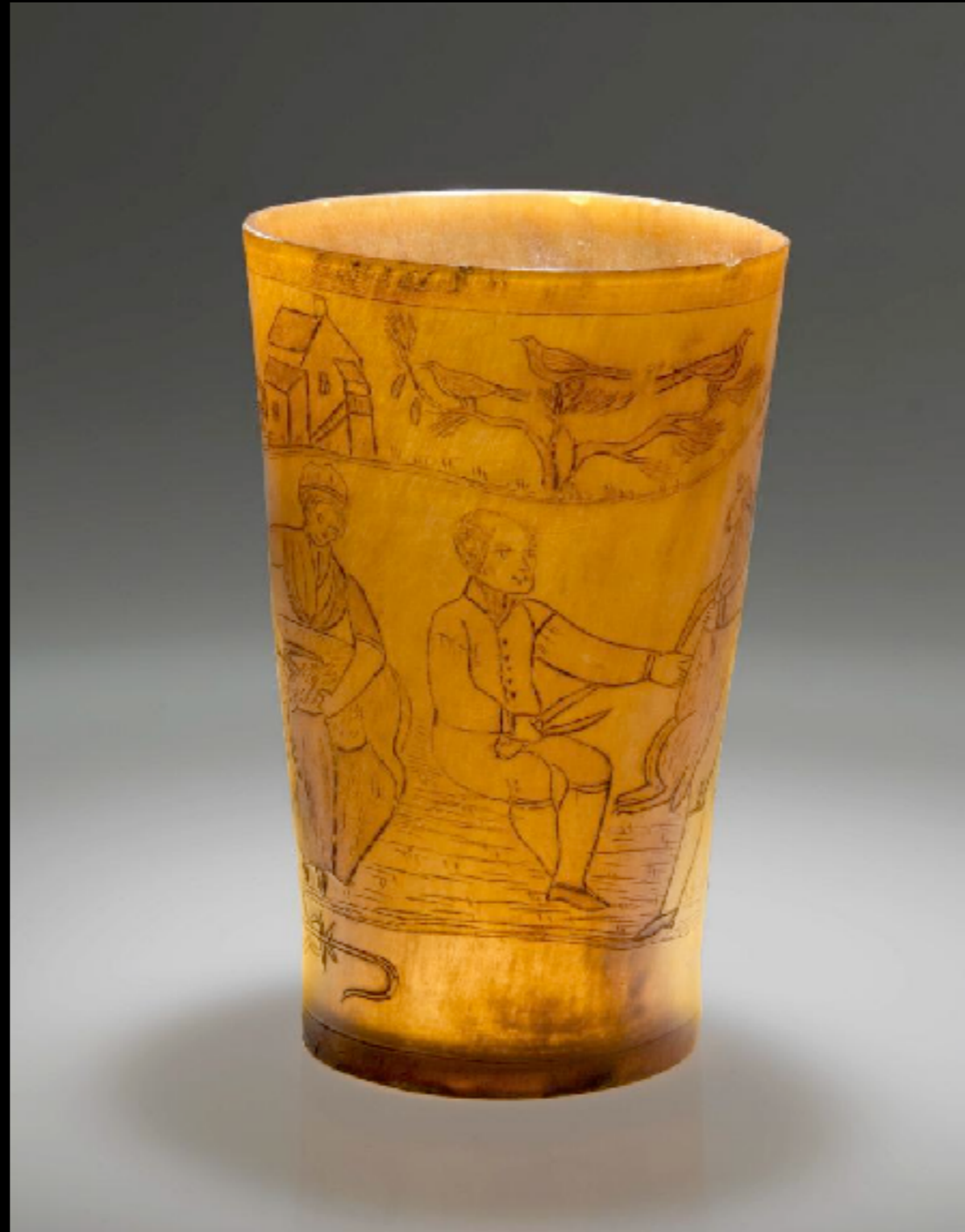
American Horn Cup Late 18th Century (Colonial Williamsburg)