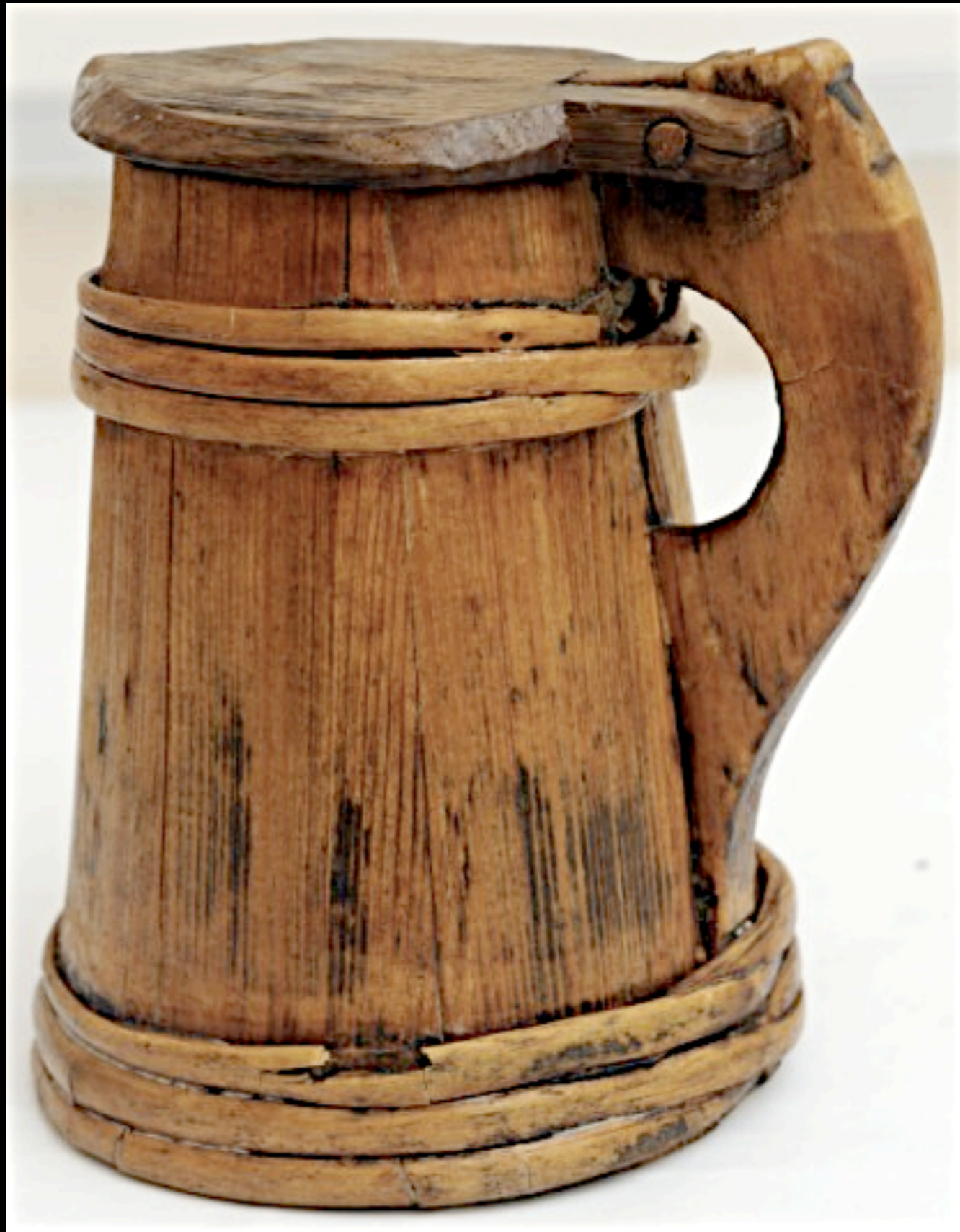
English Staved Wood Tankard with Lid & Wood Hoops Recovered from the Mary Rose Late 16th Century (The Mary Rose)