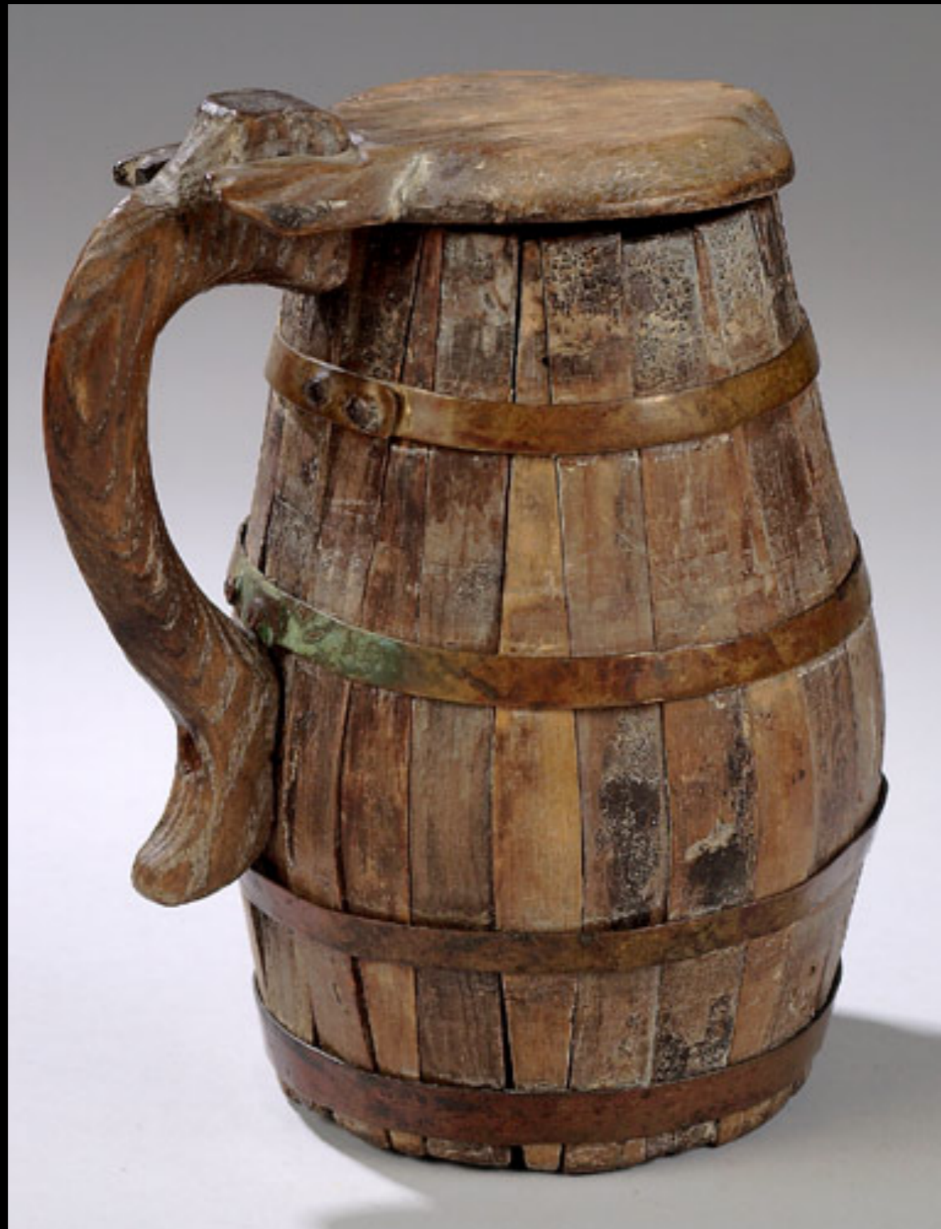
English Staved Wood Tankard with Lid & Brass Hoops Late 18th to Early 19th Century