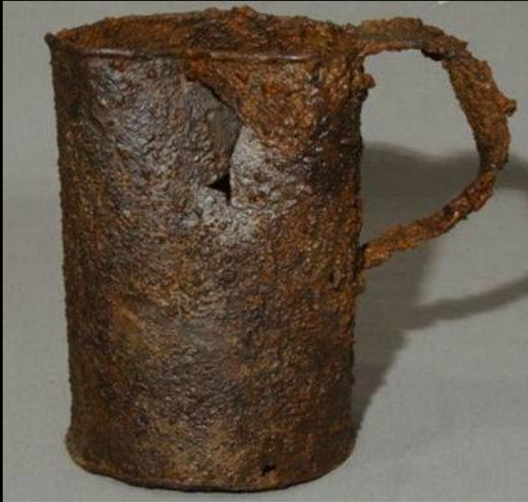
Tin Cup from the Continental Army Encampment at Ephrata Cloister, Pennsylvania