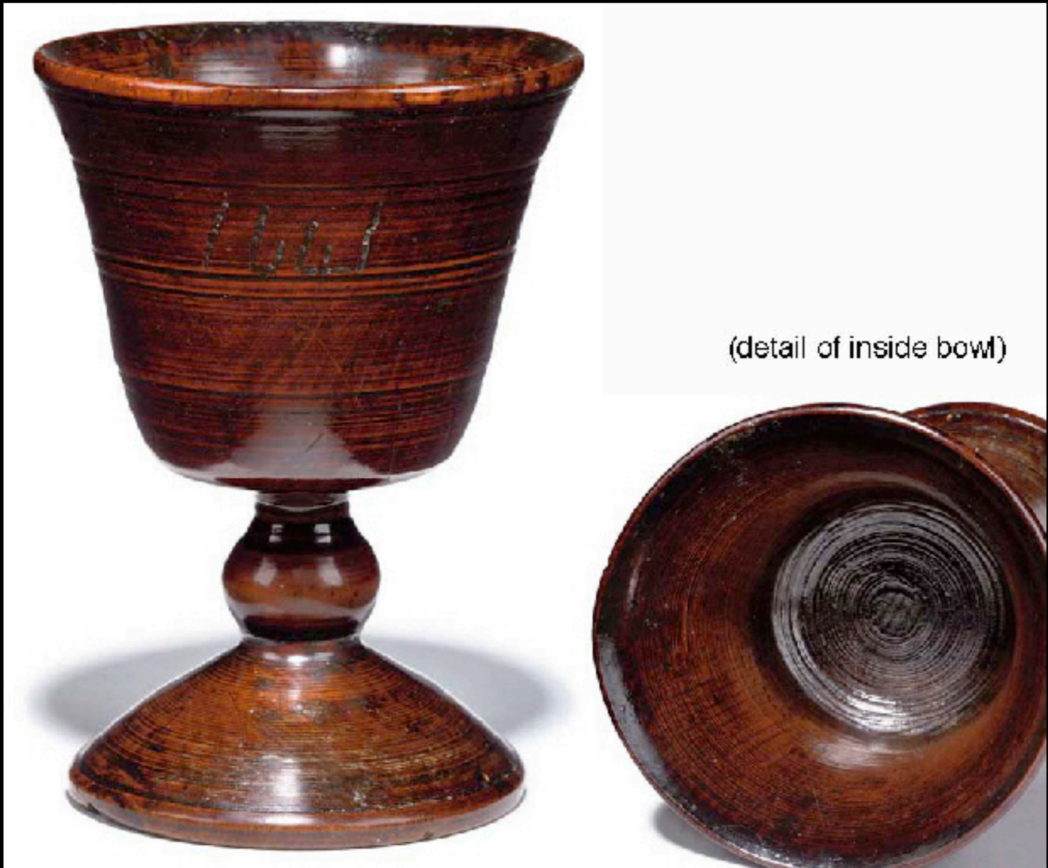
English Wood Goblet c. 1620 (Christie's)