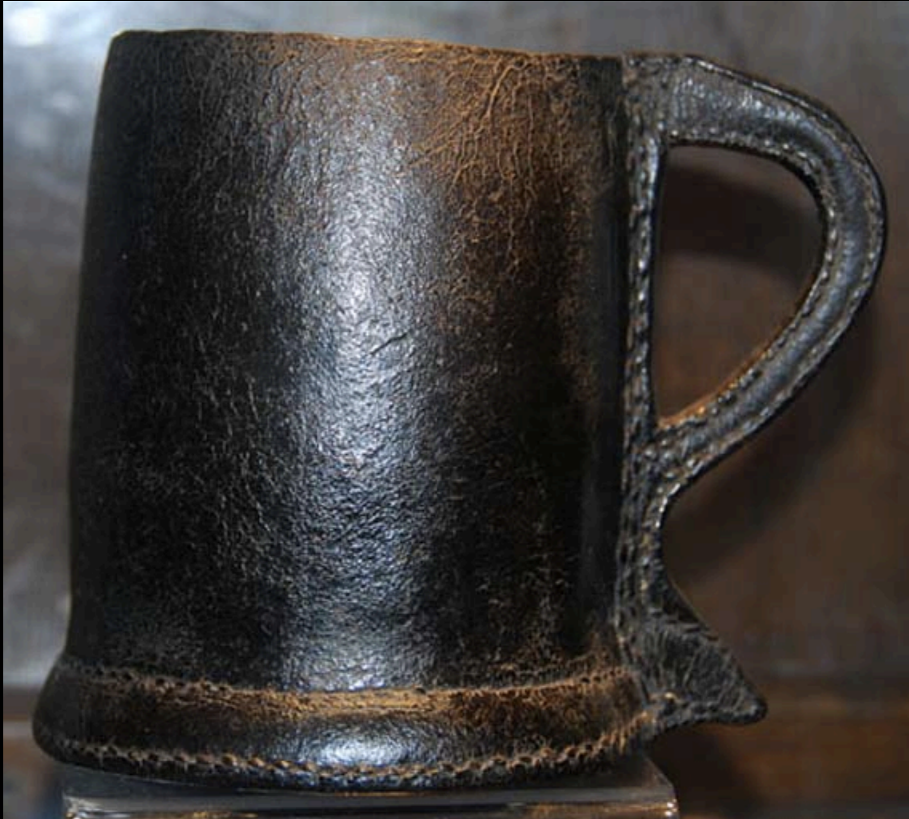
English Leather Black Jack Tankard Early 18th Century (Keith Hockin Antiques)