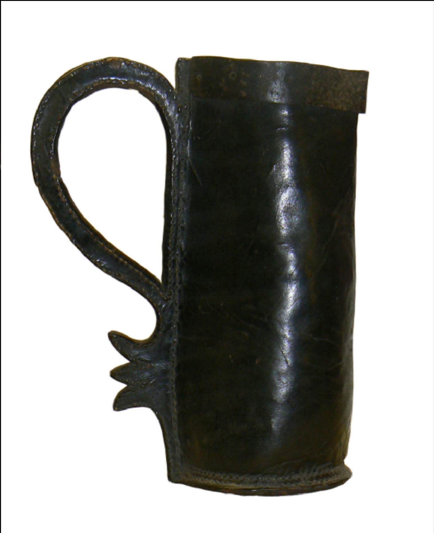
English Leather Black Jack Mug 18th Century (Lichfield Heritage Center)