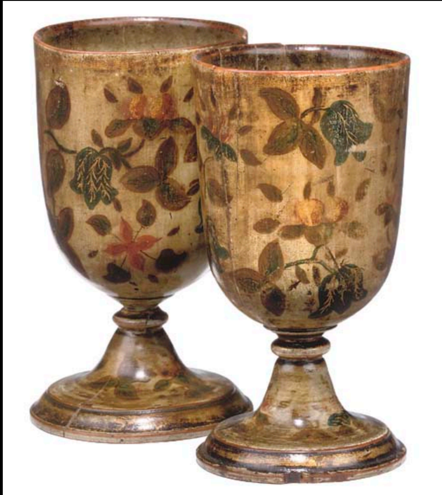
English Painted Fruitwood Goblets