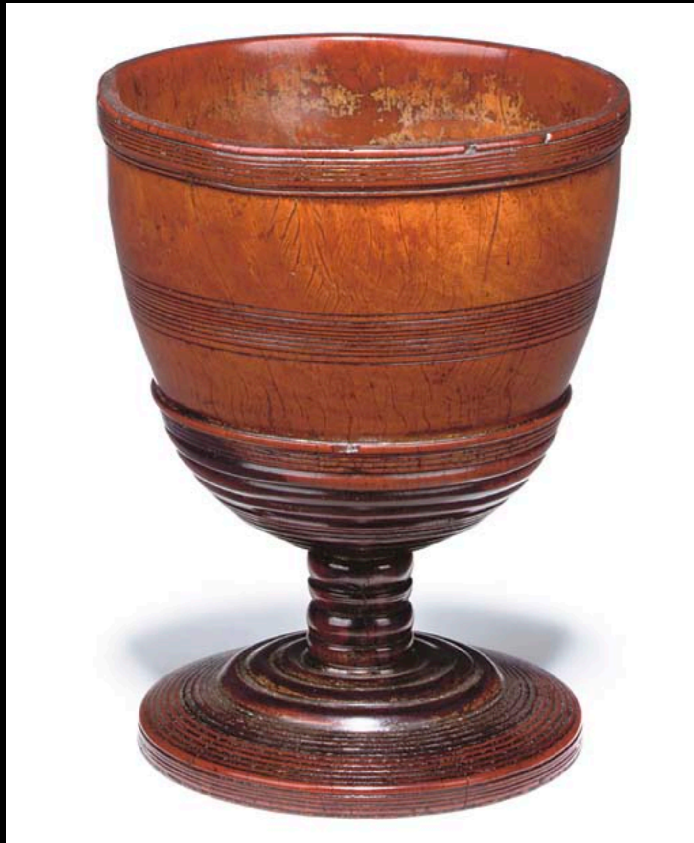
English Lignum Vitae Goblet c. 1670 (Christie's)