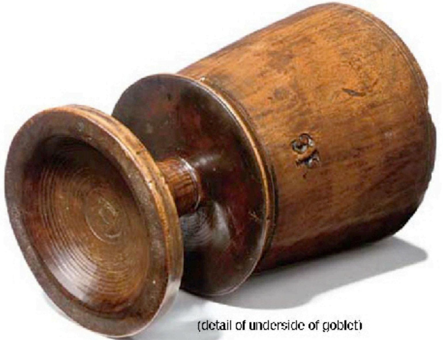
(detail of underside of goblet)