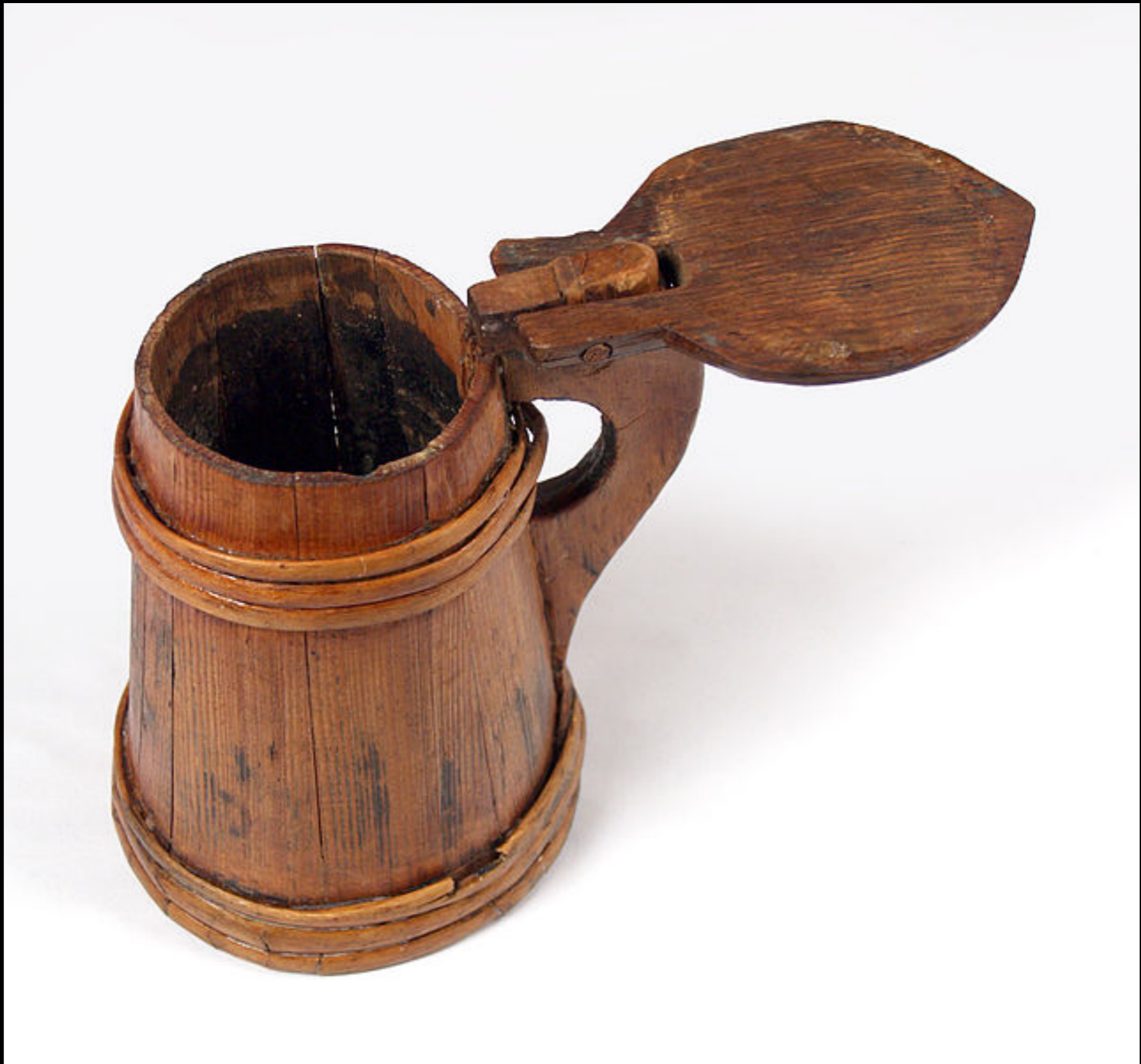
English Staved Wood Tankard with Lid & Wood Hoops Recovered from the Mary Rose Late 16th Century (The Mary Rose)