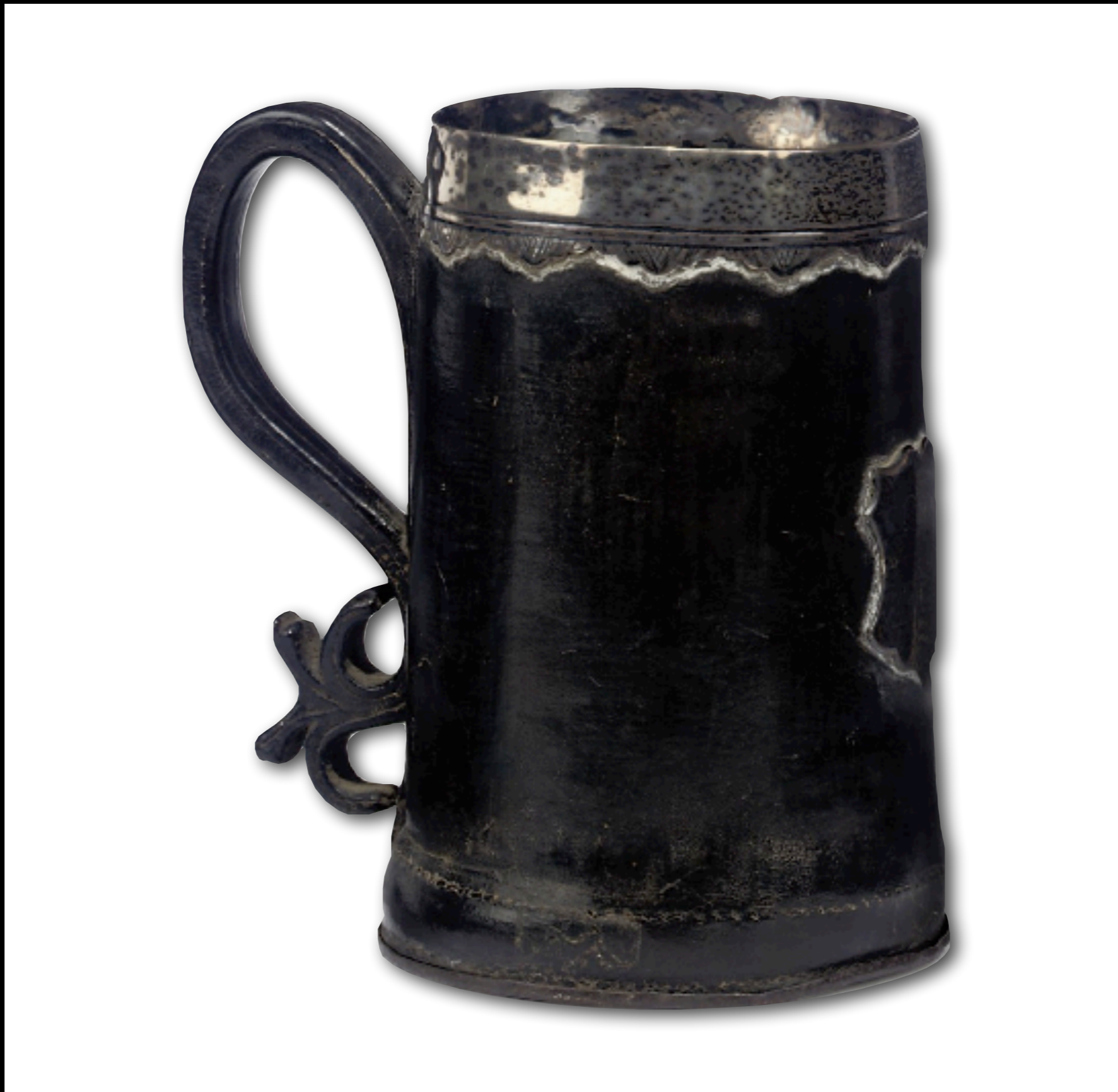
English Silver - Mounted Leather Black Jack Tankard with Applied Shield Engraved "M & R" with 2 Hearts