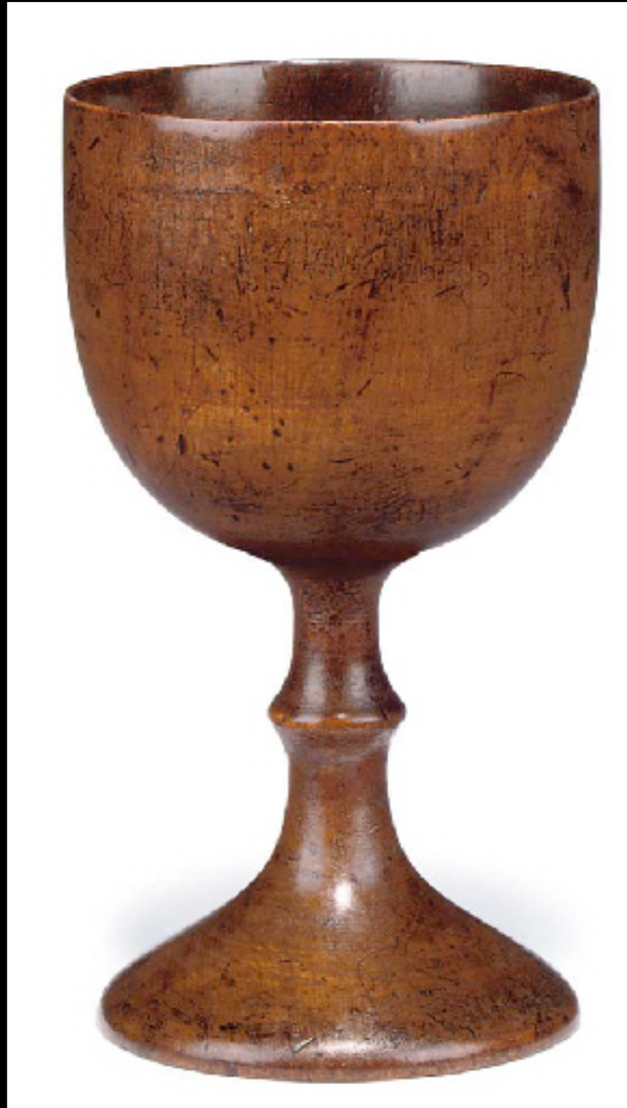
English Fruitwood Goblet