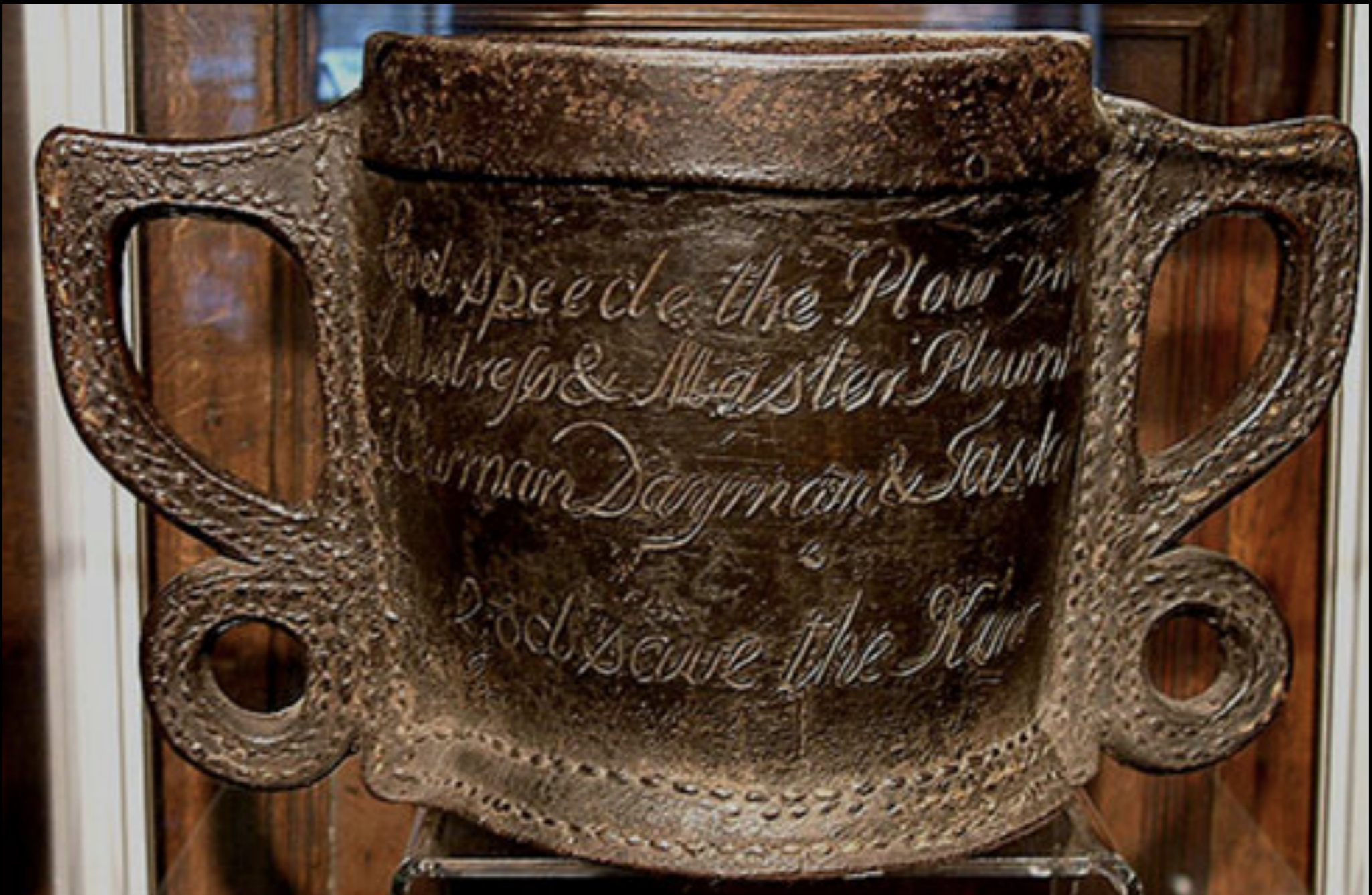
English Leather Harvest Black Jack Tankard

"God speede the plow and mistress and master plowman, cowman and tasker... God save the King"