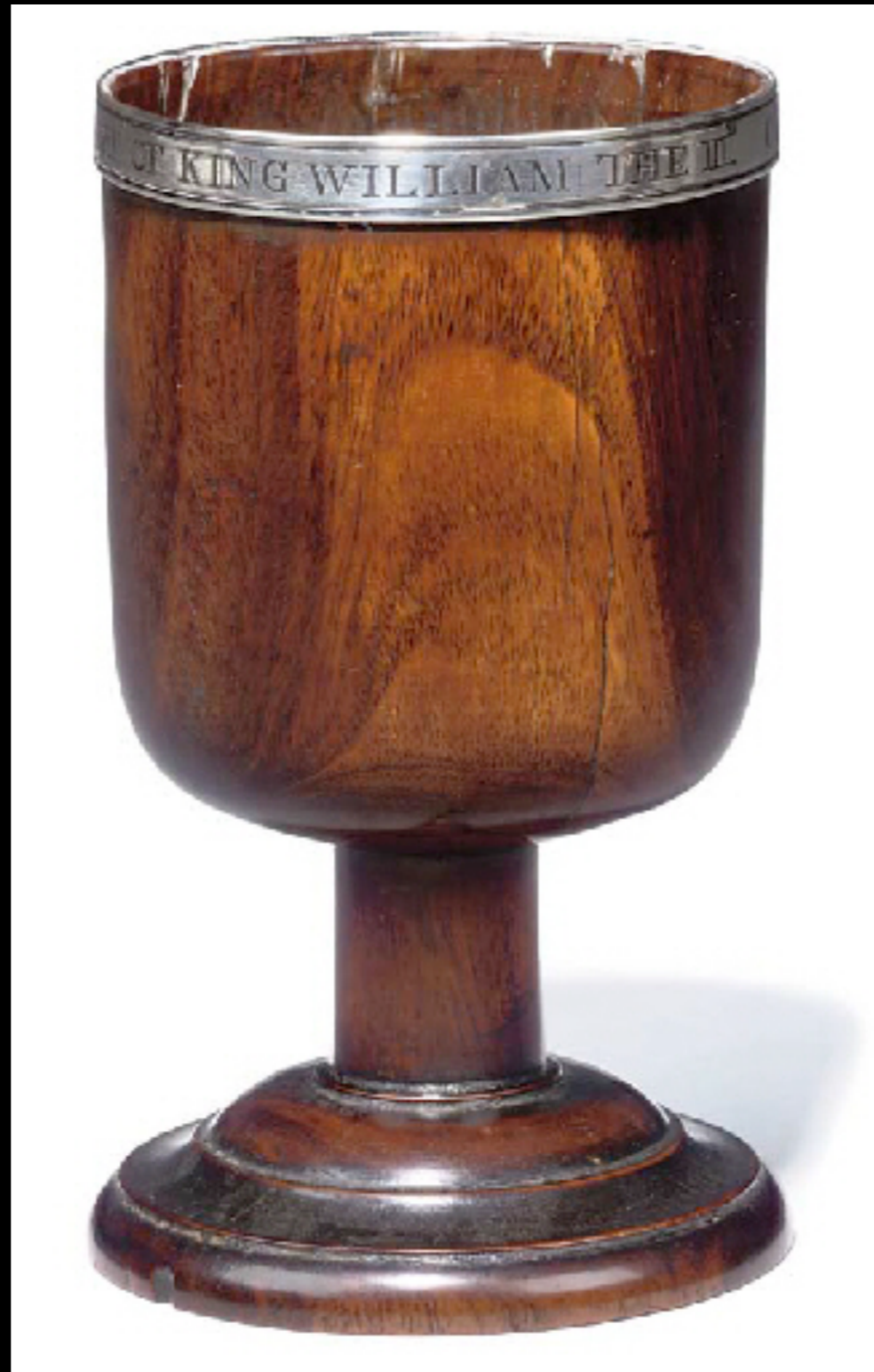
English Silver Mounted Lignum Vitae Goblet "THE GLORIOUS MEMMORY OF KING WILLIAM III Corp'. Of Carrickfergshire" c. 1670 (Christie's)