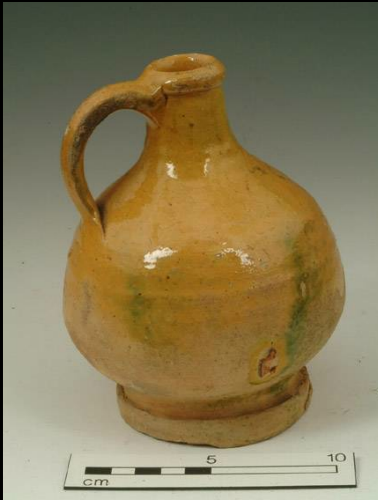
English Lead Glazed Earthenware Bottle from Surrey / Hampshire Border c. 1550 - 1700 (Museum of London)