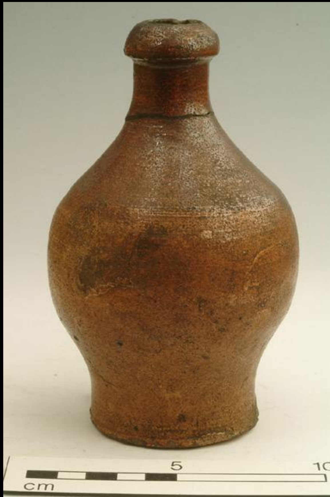
English Salt Glazed Stoneware Bottle from Fulham / Hammersmith, London c. 1671 - 1700 (Museum of London)