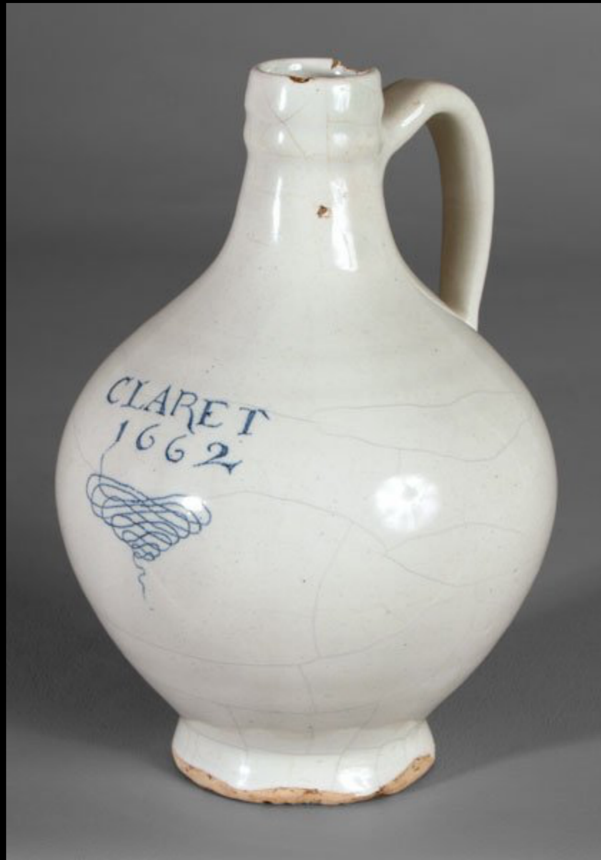
English or Dutch Tin Glazed Earthenware Sack Bottle 1662