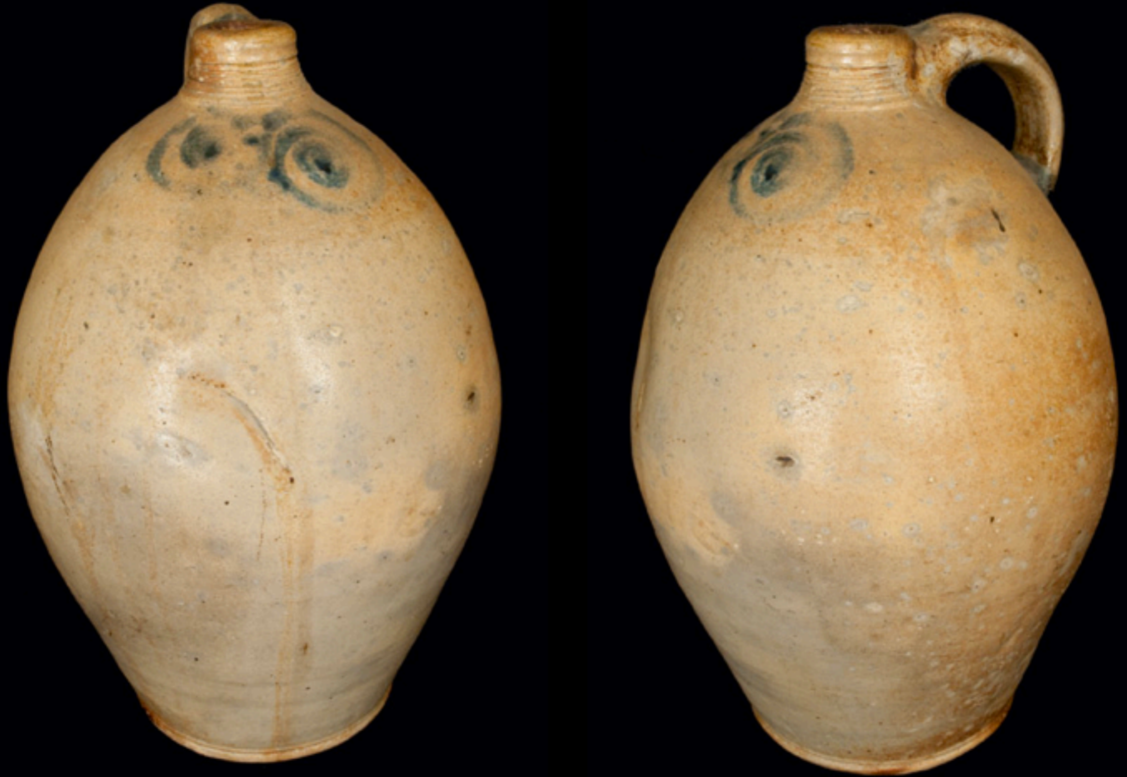
American 3 Gallon Stoneware Jug with Watchspring Decoration from New Jersey or Manhattan, New York c. Late 18th Century (Crocker Farm Auction House)