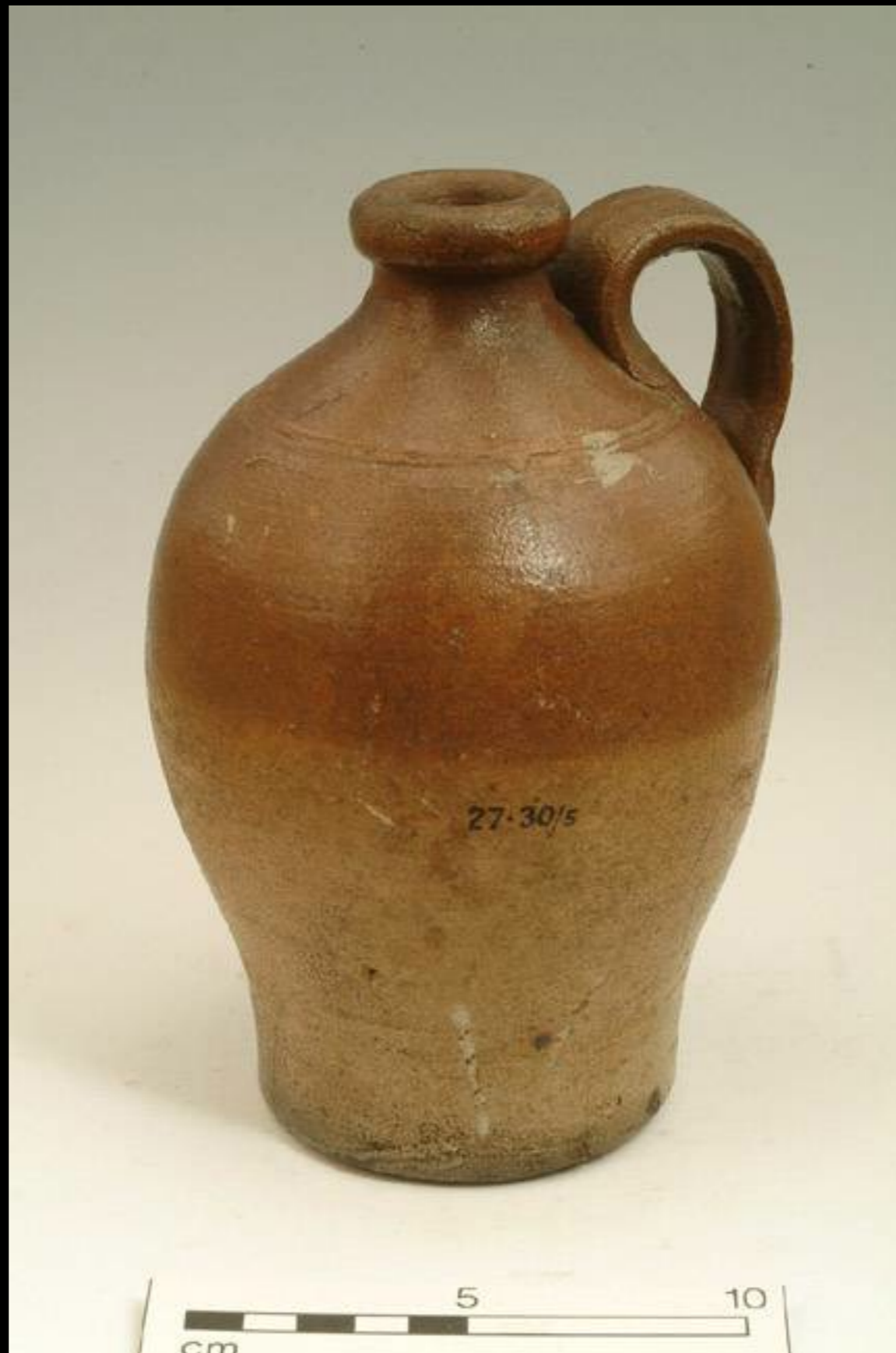
English Salt Glazed Stoneware Bottle from Fulham / Hammersmith, London c. 1601 - 1700 (Museum of London)