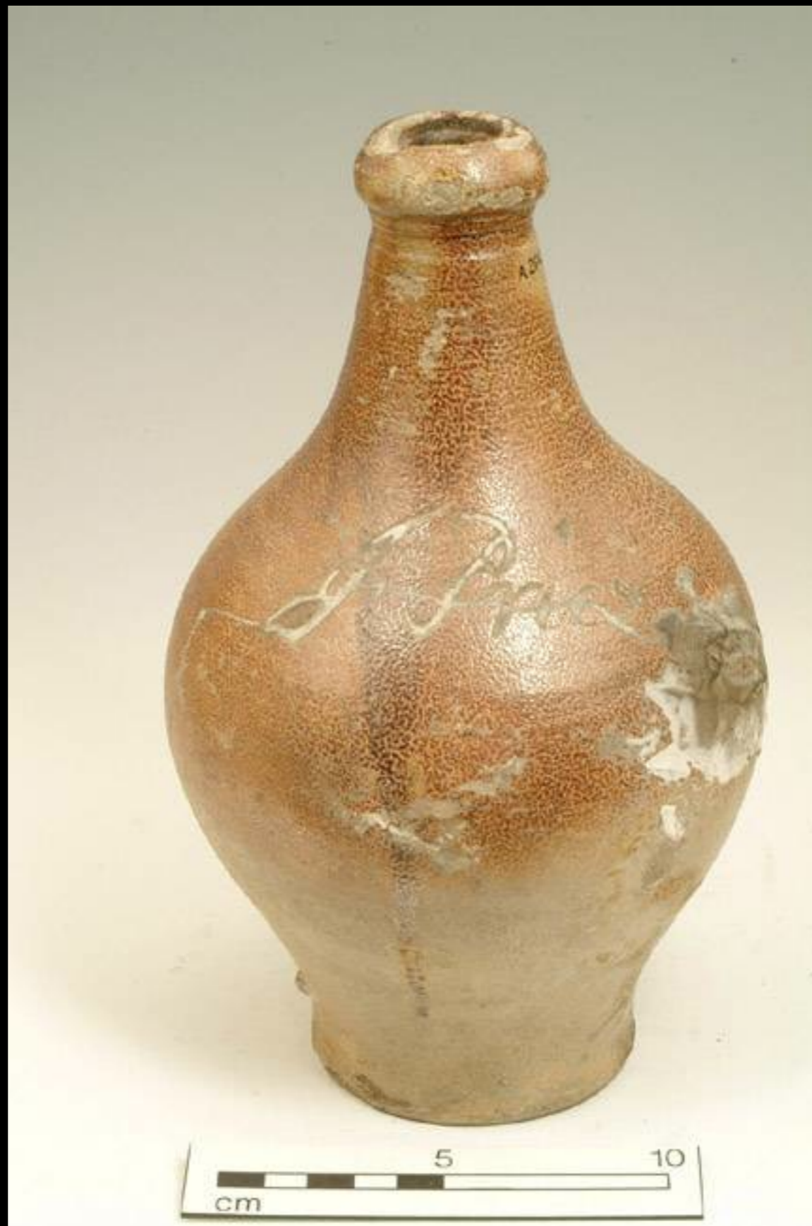
English Salt Glazed Stoneware Bottle from Fulham / Hammersmith, London c. 1700 (Museum of London)