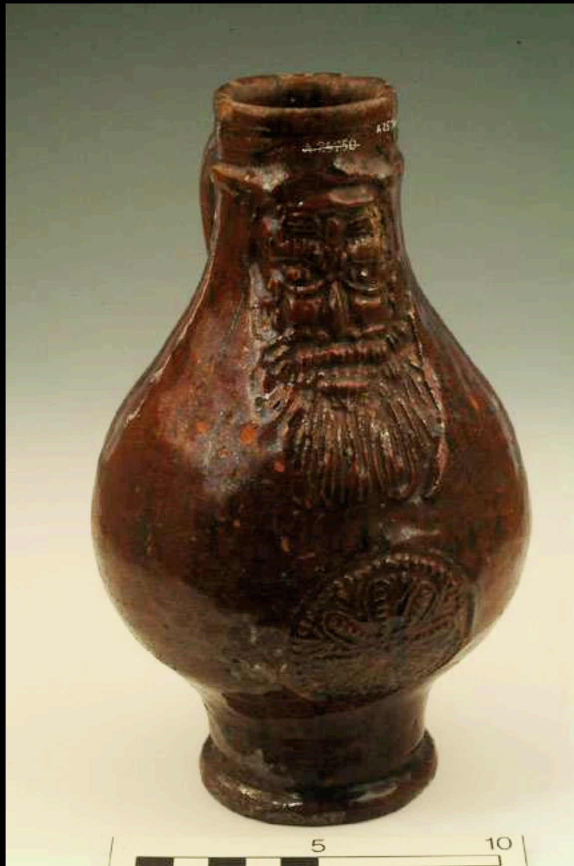
English Lead Glazed Earthenware Copy of a "Bartmann" Jug c. 1601 - 1700 (Museum of London)