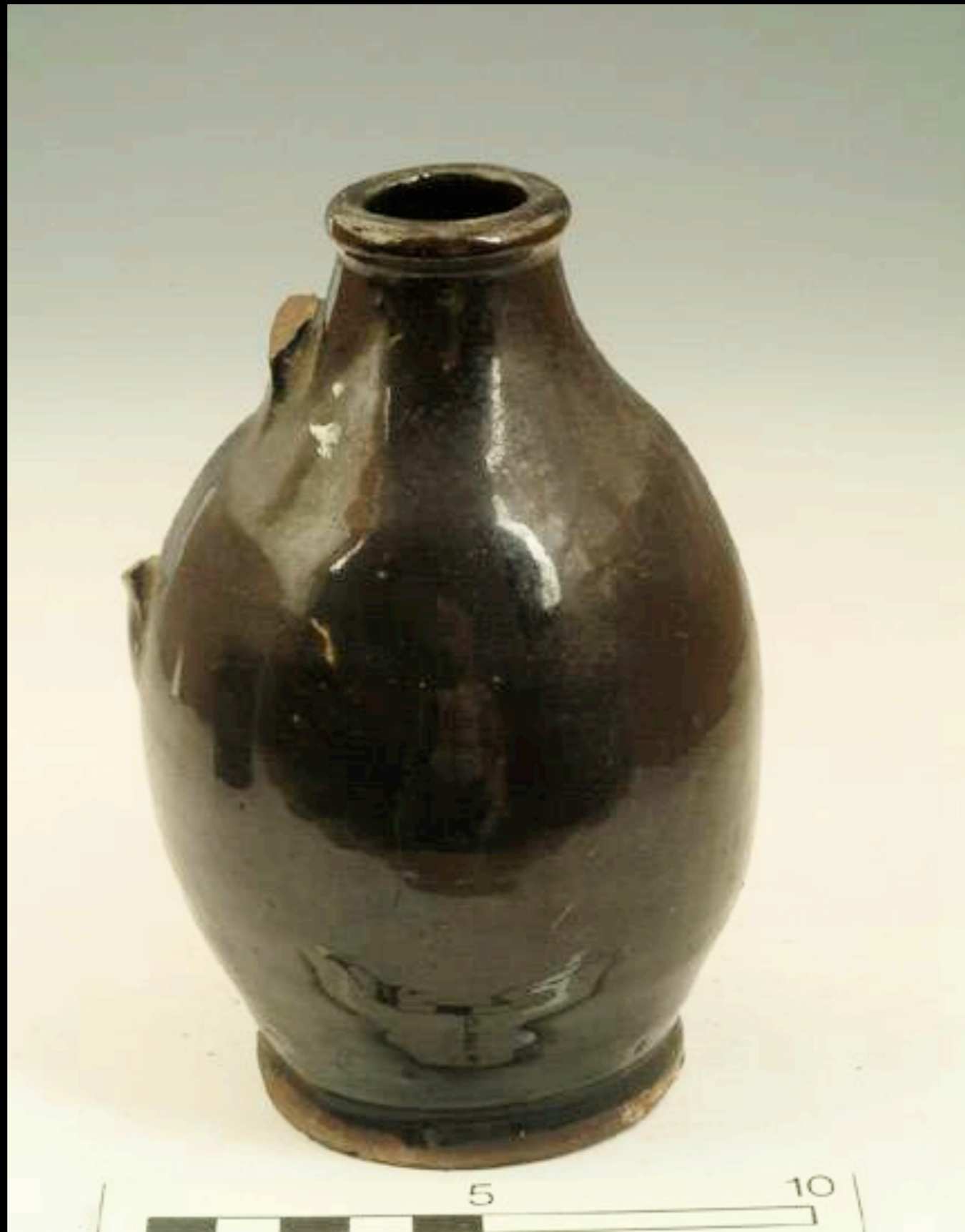
English Lead Glazed Earthenware Cistercian Bottle c. 1481 - 1800 (Museum of London)