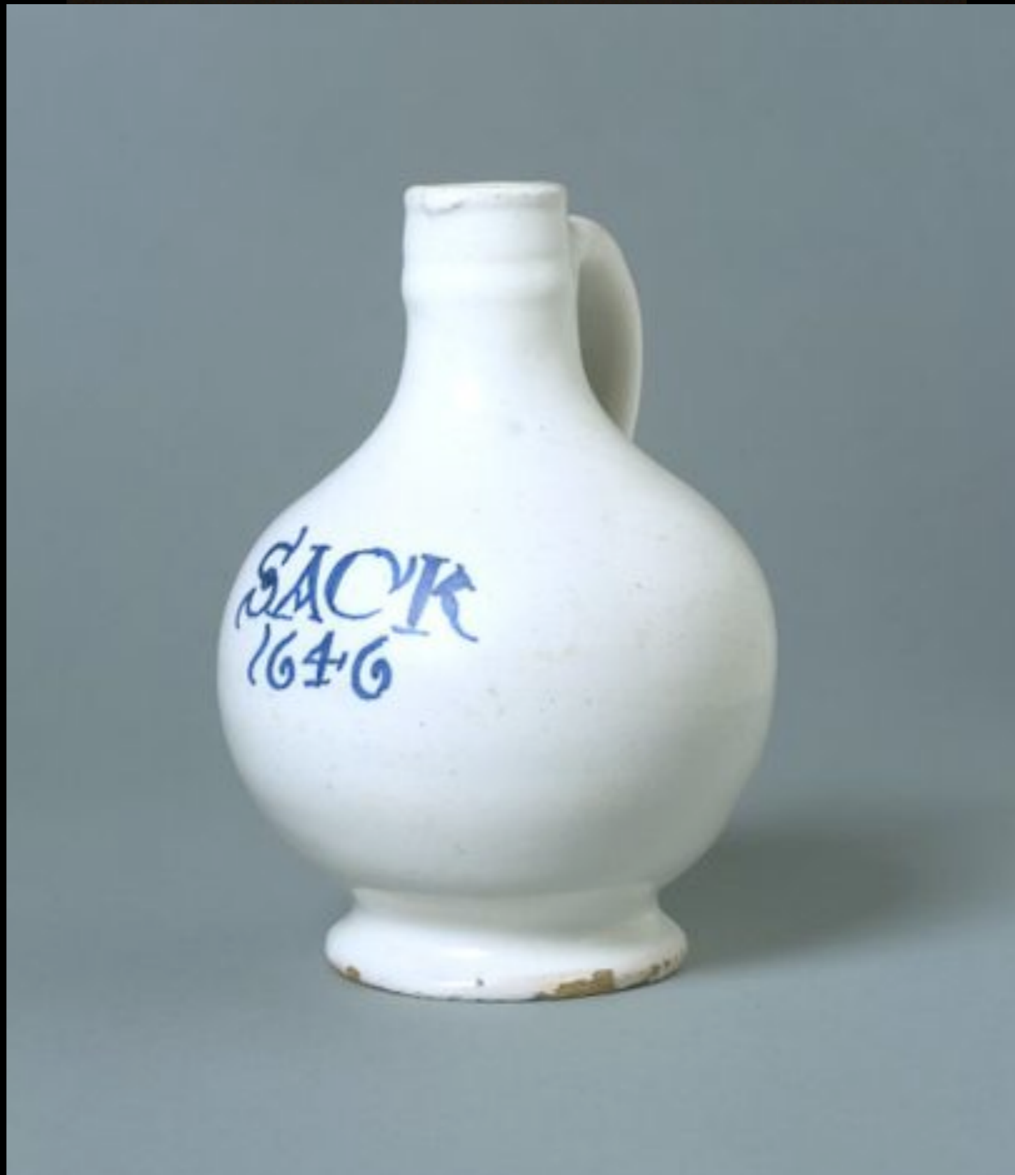
English or Dutch Tin Glazed Earthenware Sack Bottle