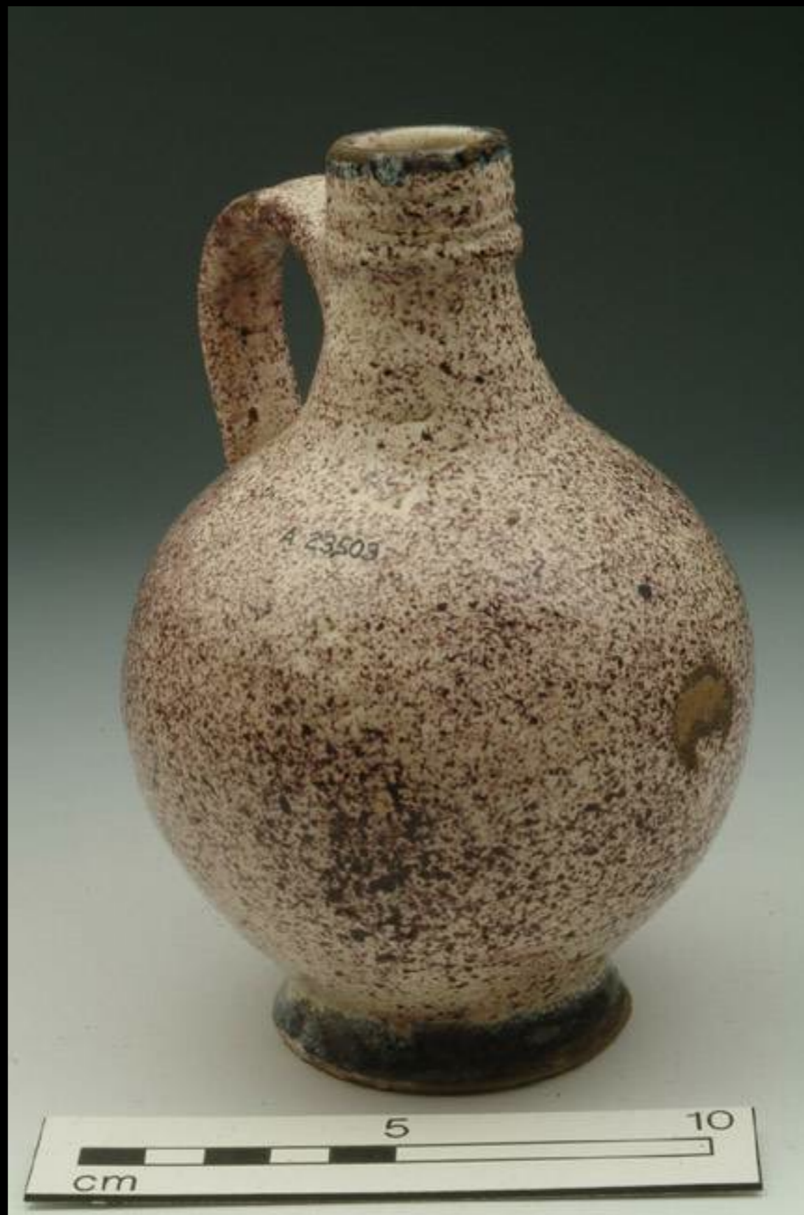
English or Dutch Tin Glazed Earthenware Bottle c. 1601 - 1700 (Winterthur)