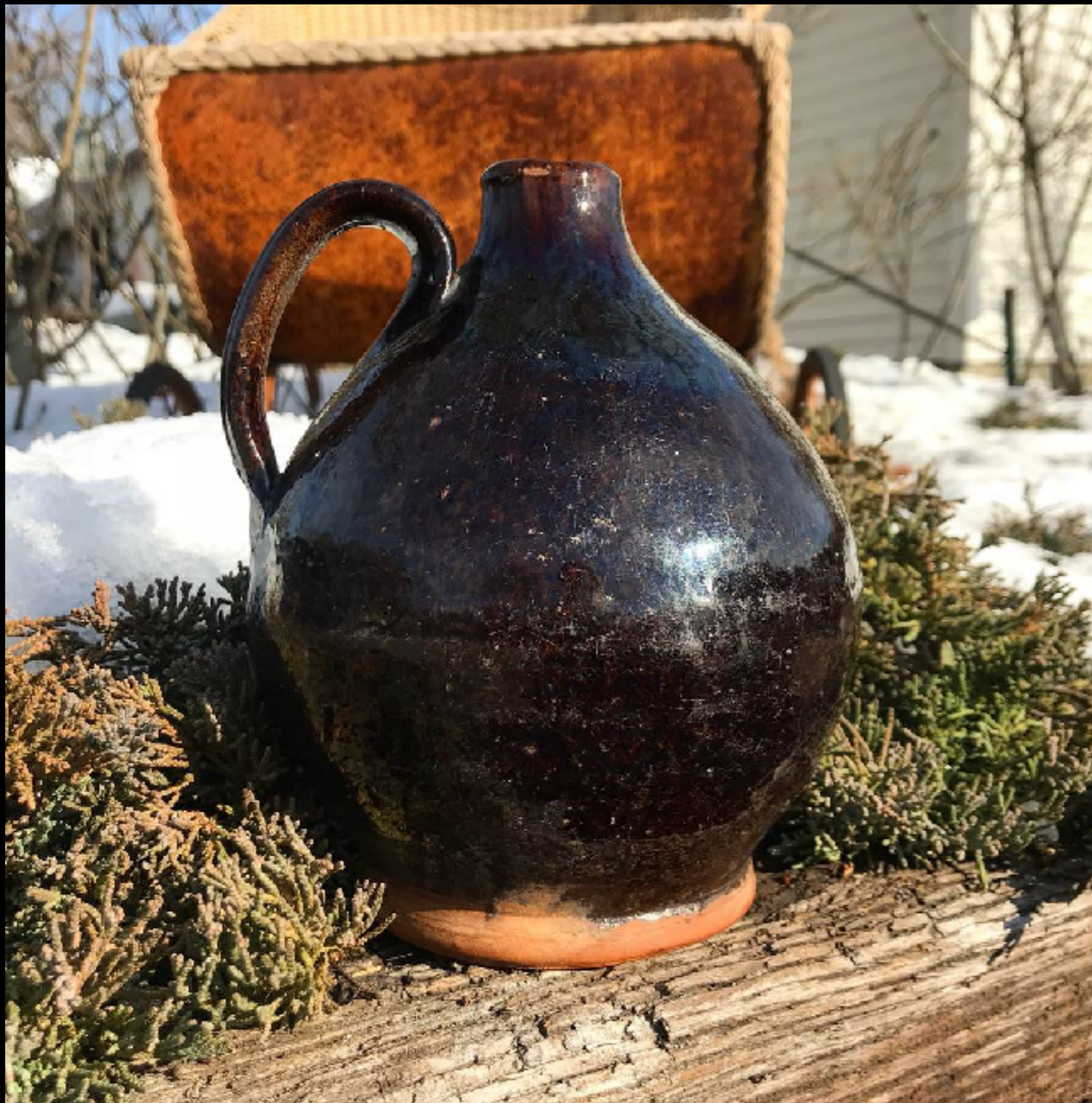
American Lead Glazed Earthenware Jug Likely from Massachusetts (6.5")

Likely Made by a Potter from the Boyce, Chace, Purintan or Shove Families From Berkely or Somerset, MA c. 1770 - 1830