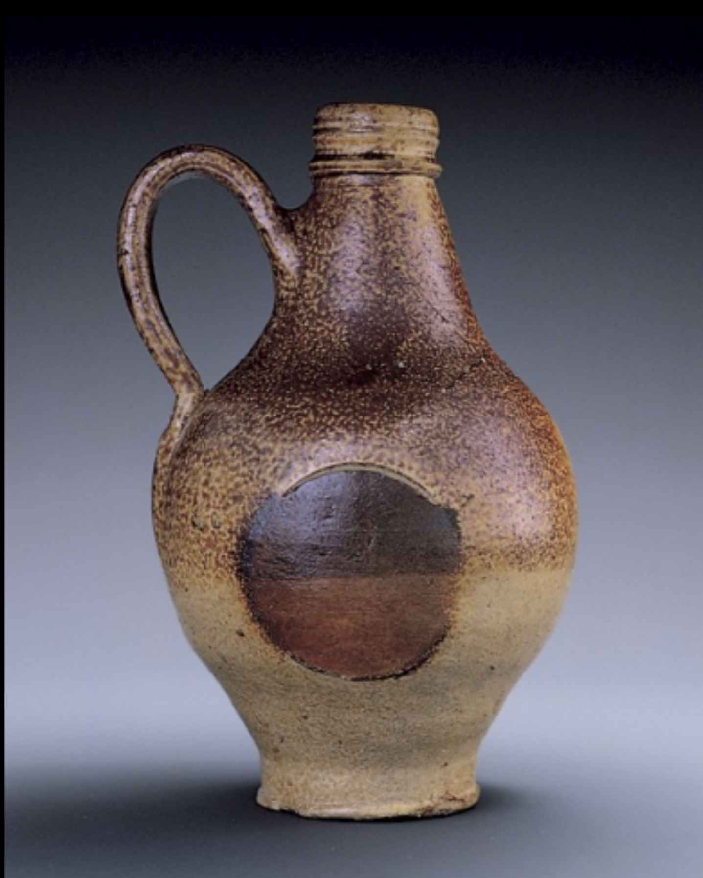
English Salt Glazed Stoneware Bottle from London