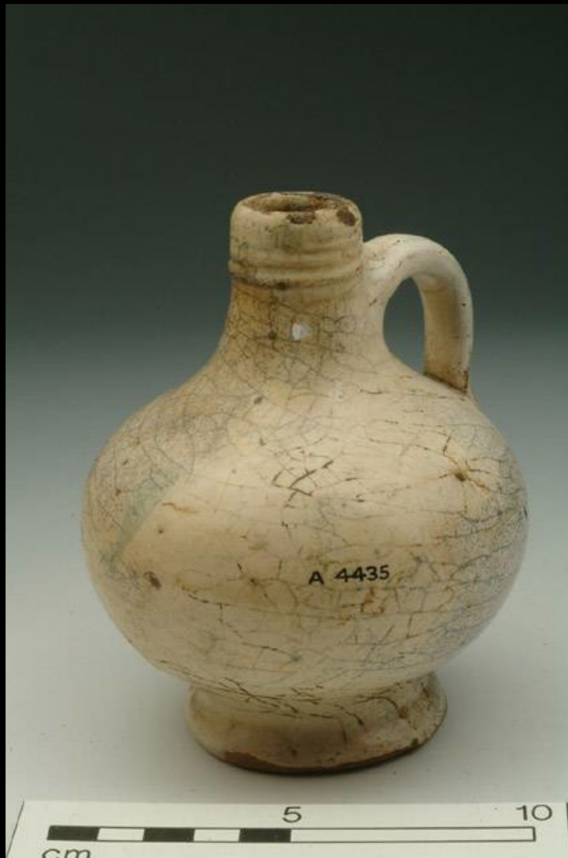
English or Dutch Tin Glazed Earthenware Bottle c. 1601 - 1800 (Museum of London)