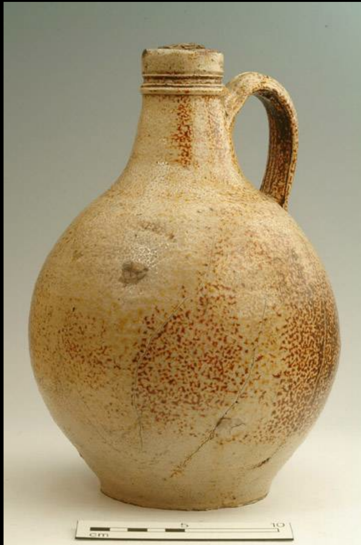
English Salt Glazed Stoneware Bottle from London c. 1671 - 1800 (Museum of London)