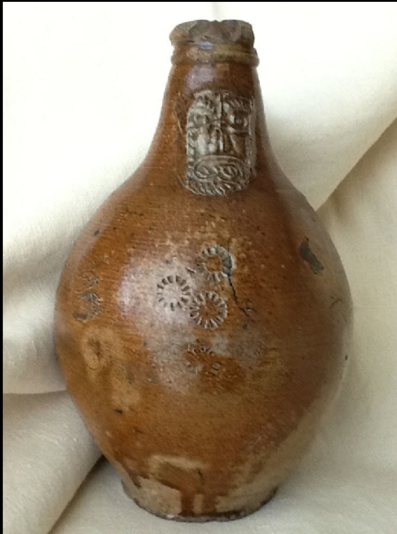
Bellarmino Bottle 17th Century (Steve Rayner Collection)