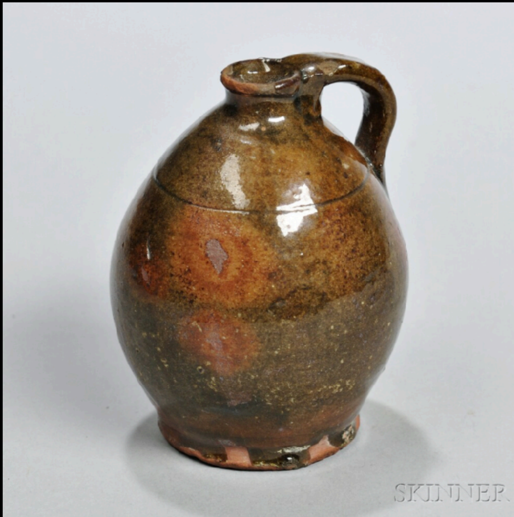
American Lead Glazed Earthenware Jug from New Hampshire Late 18th - Early 19th Century (Skinner)