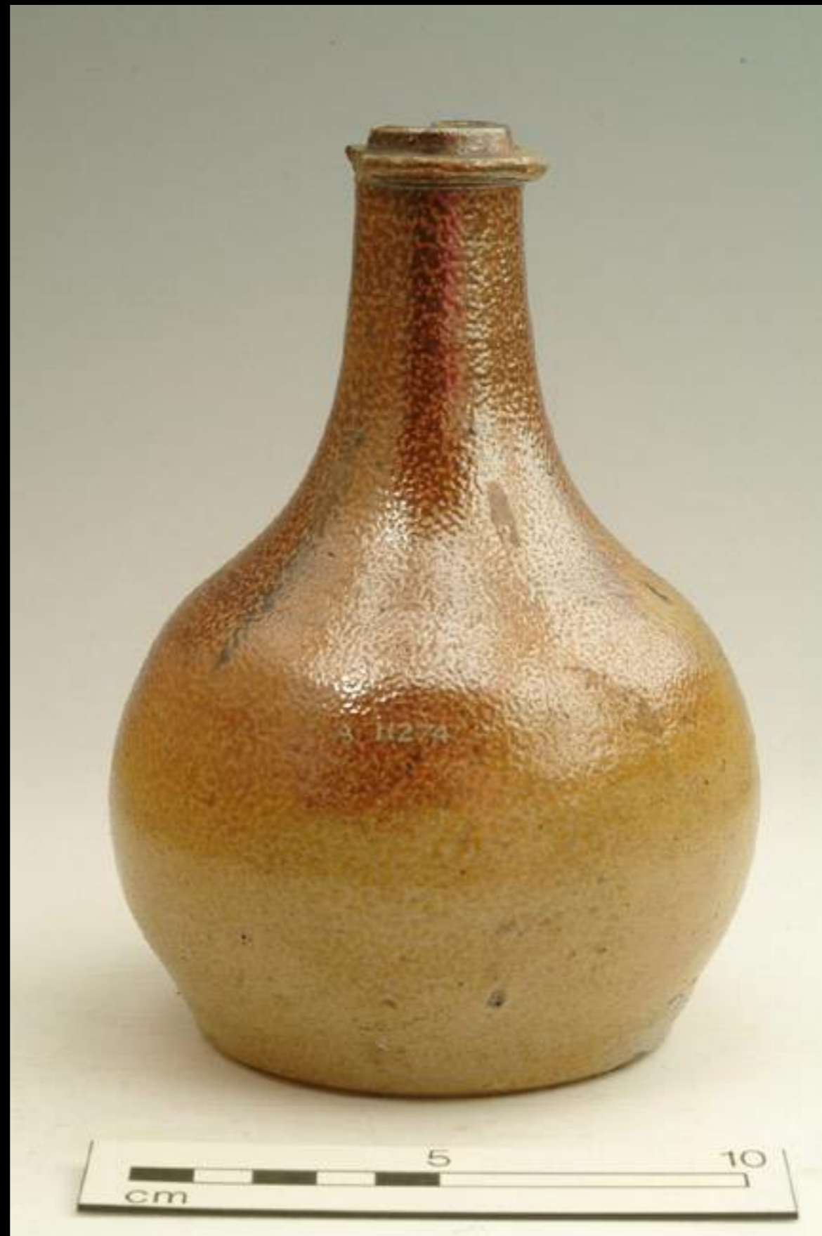
English Salt Glazed Stoneware Bottle from Neck Similar to a Glass Bottle from Fulham / Hammersmith, London c. 1671 - 1703 (Museum of London)