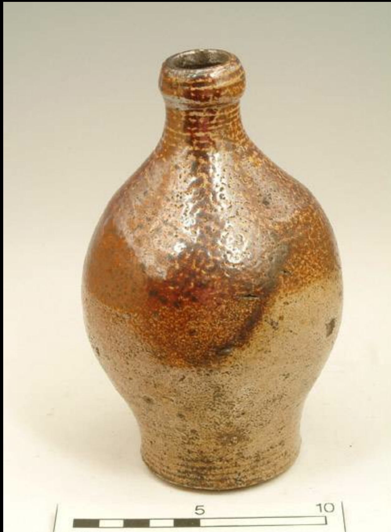
English Salt Glazed Stoneware Bottle from Fulham / Hammersmith, London c. 1701 - 1800 (Museum of London)