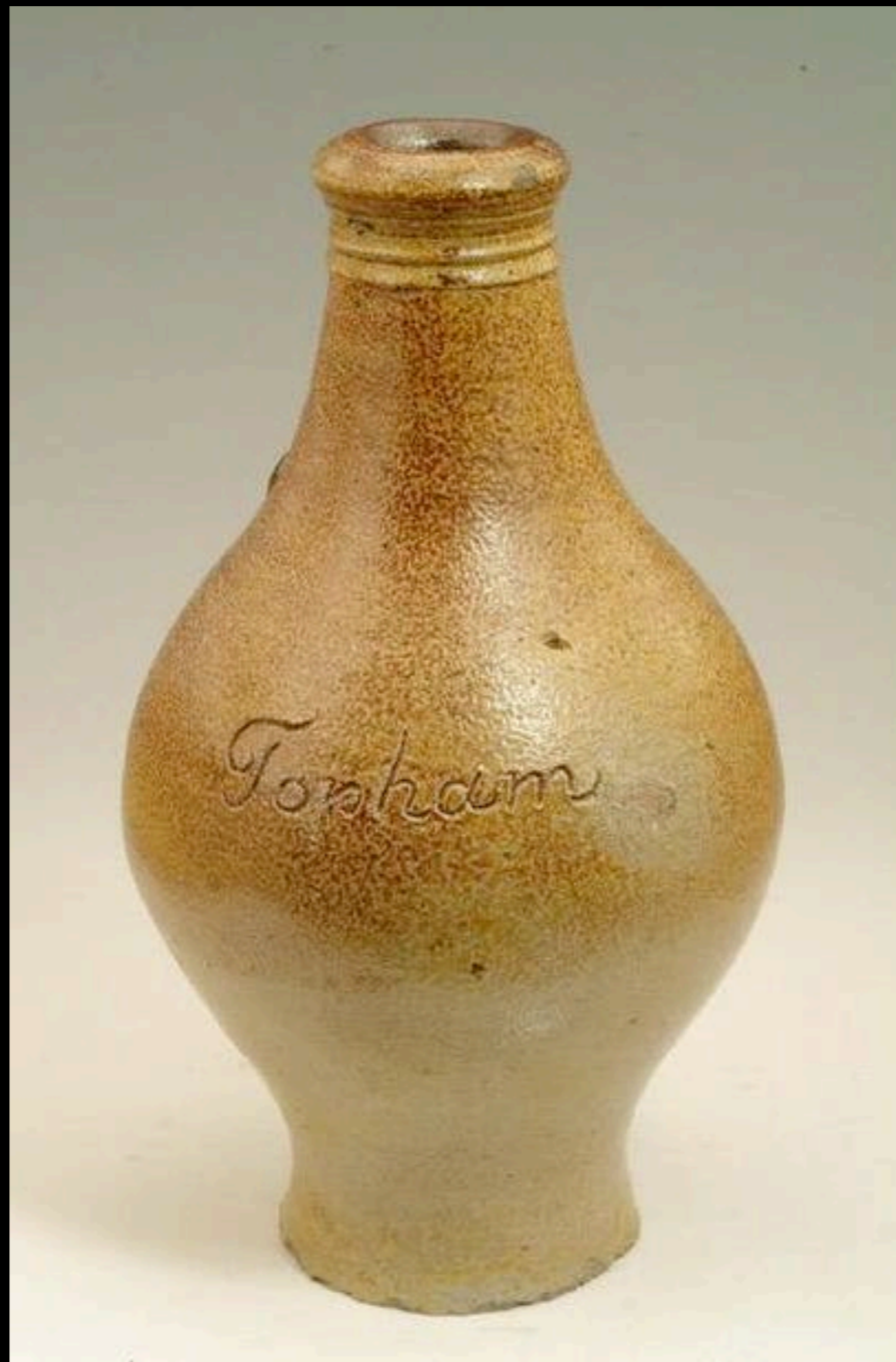
English Salt Glazed Stoneware Bottle Inscribed "Topham" from Mortlake, London (Richmond - upon - Thames) c. 1701 - 1800 (Museum of London)