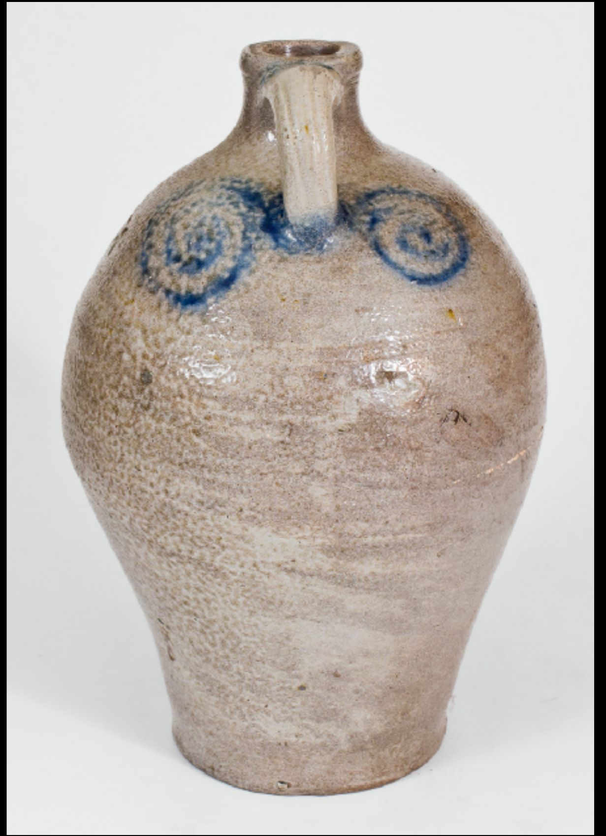
American 2 Gallon Stoneware Jug with Watchspring Decoration from Ringoes, New Jersey Attributed to the Kemple Pottery c. 1746 - 1795 (Crocker Farm Auction House)