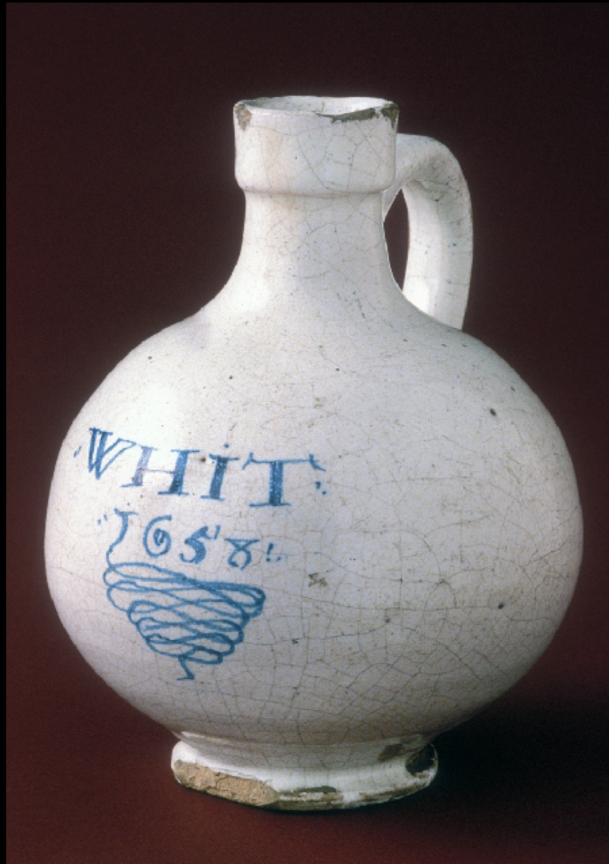
English Tin Glazed Earthenware Whit Bottle from London 1658 (Winterthur)