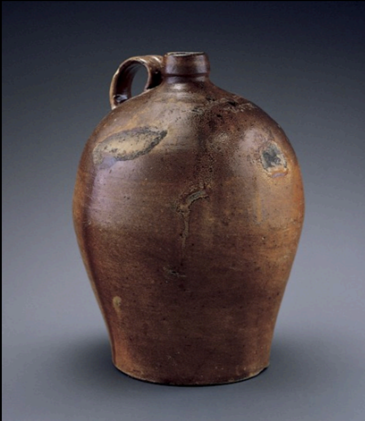
English Salt Glazed Stoneware Bottle from London, Probably Fulham by Brandram, Templeman & Jacquec c. 1784 - 1805