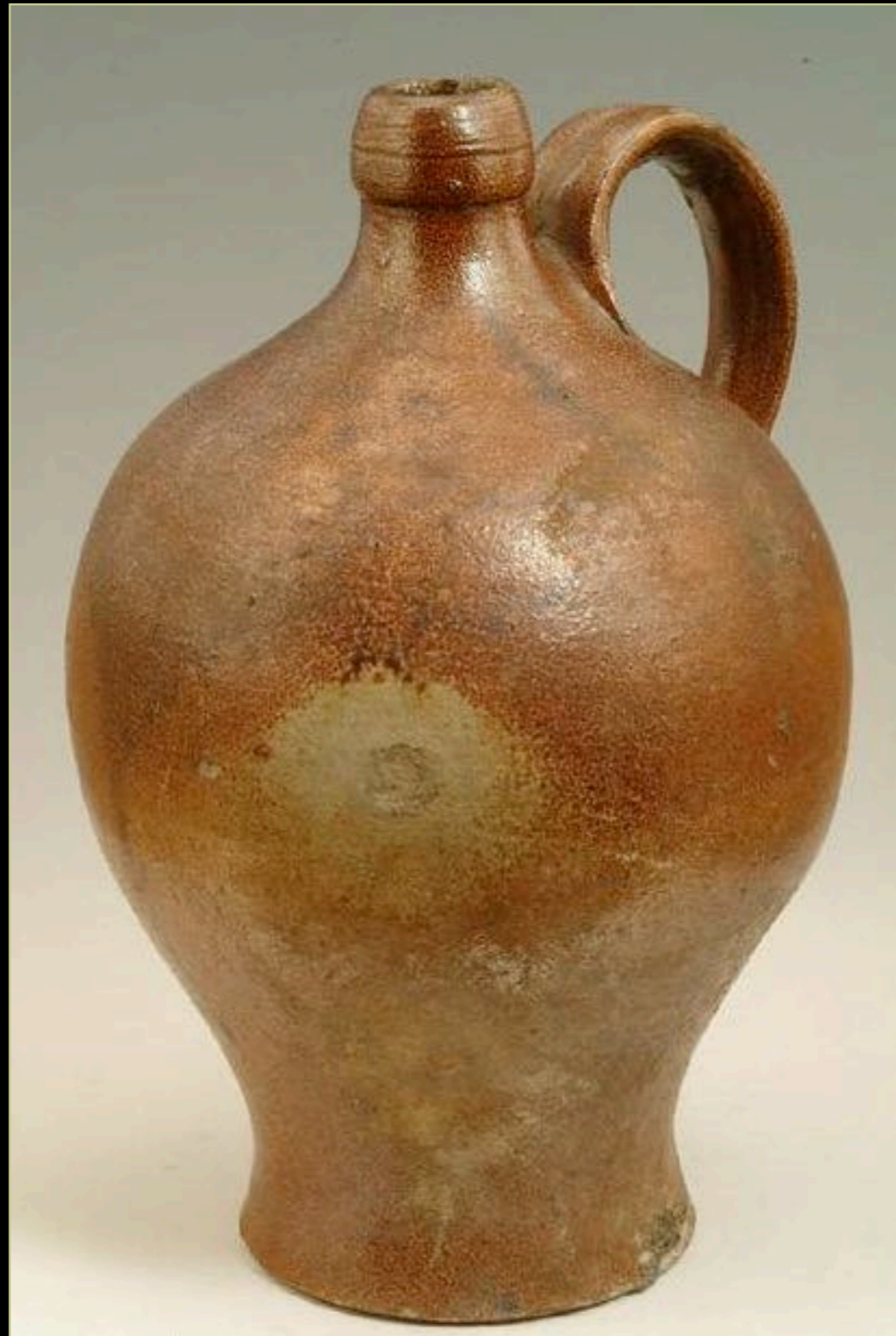
English London Jug c. 1766 - 1800 (Museum of London)