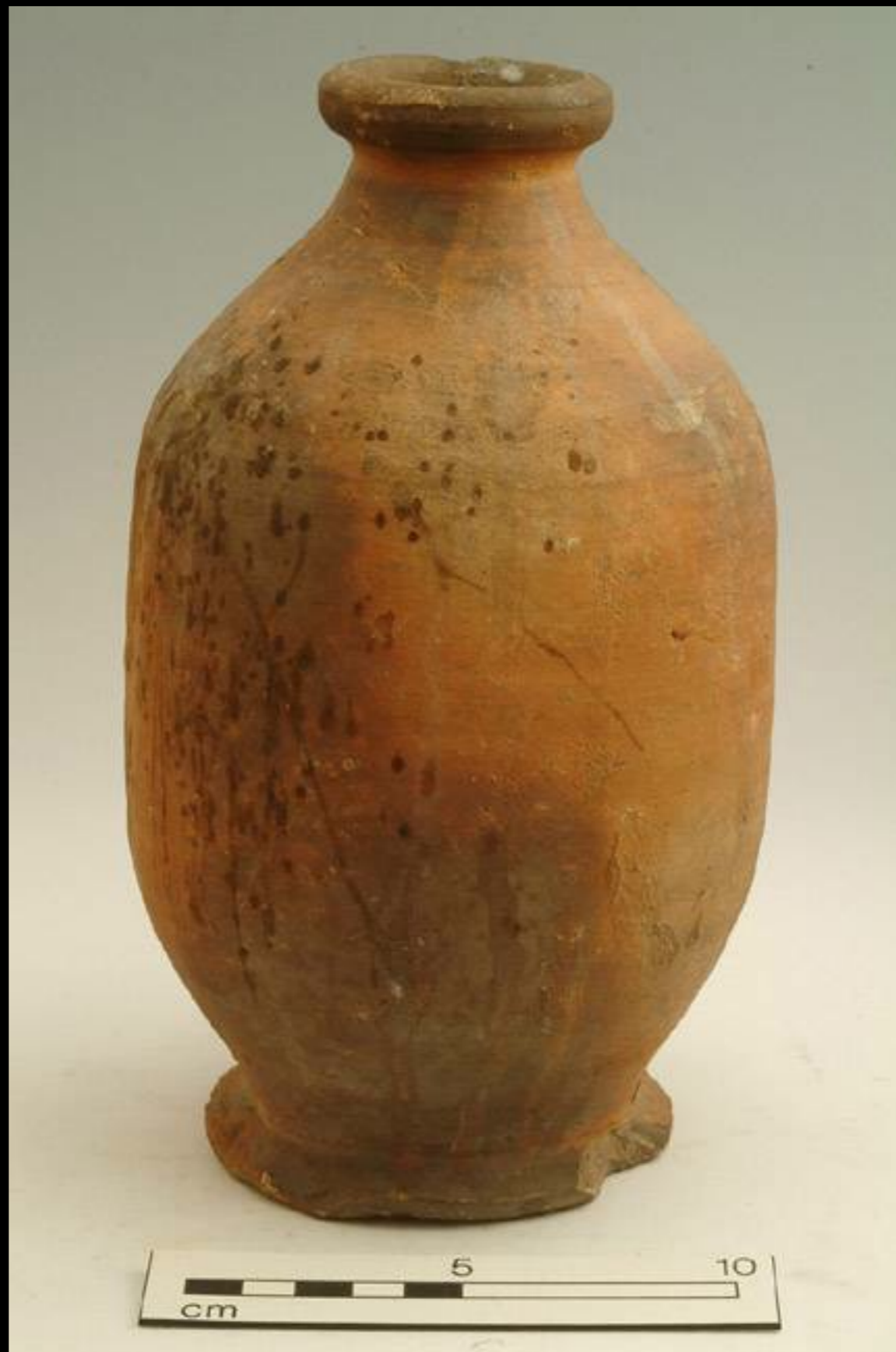
English ? Earthenware Bottle c. 1601 - 1700 (Museum of London)