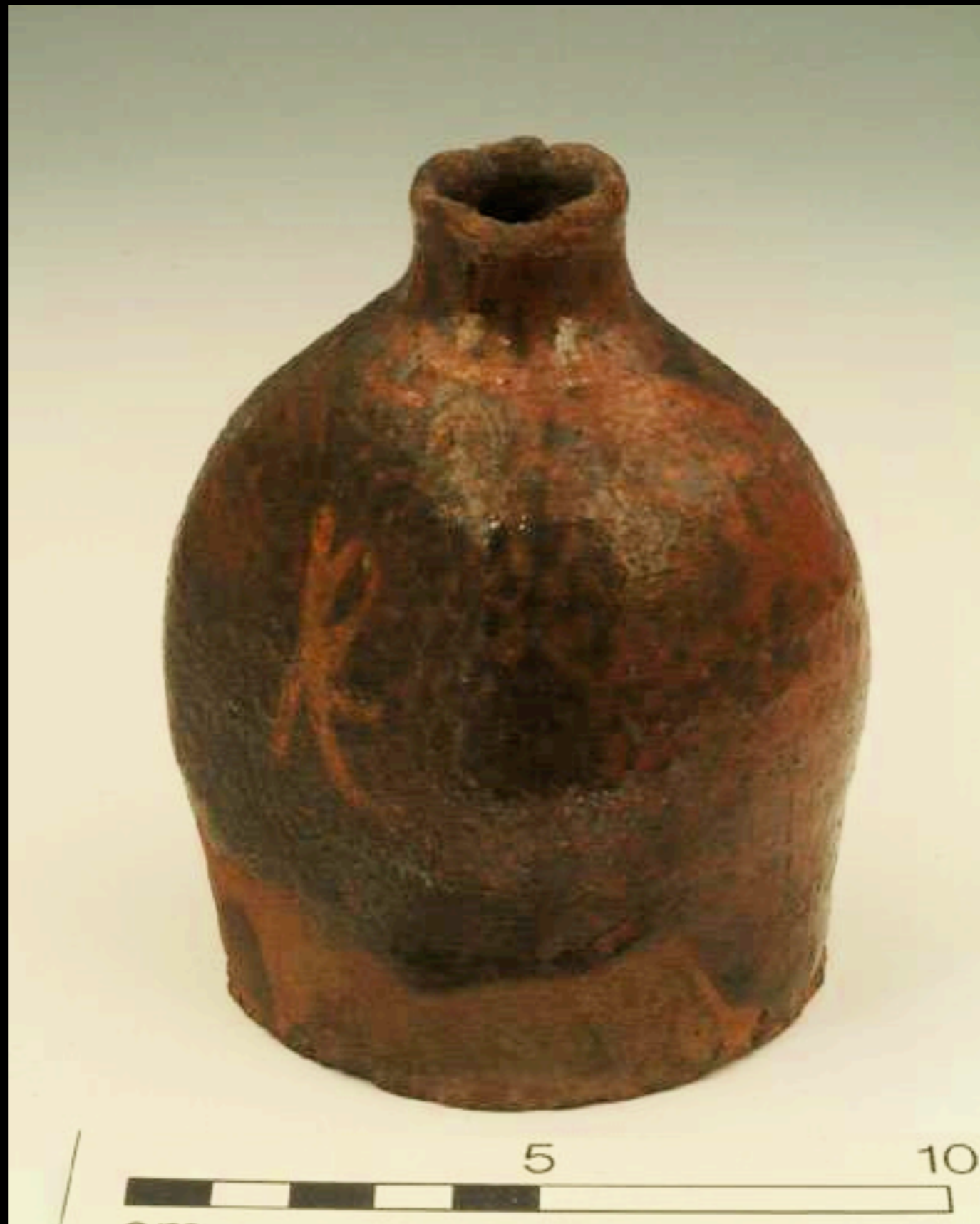
English Lead Glazed Earthenware Bottle c. 1485 - 1714 (Museum of London)