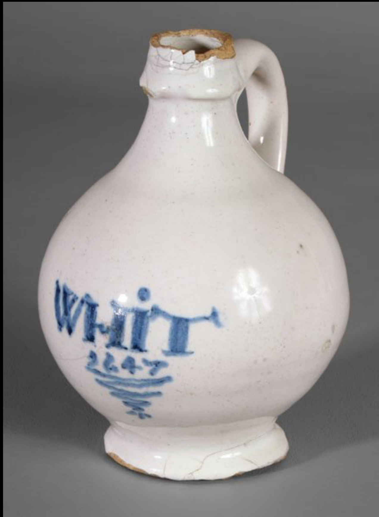
English or Dutch Tin Glazed Earthenware Whit Bottle from London