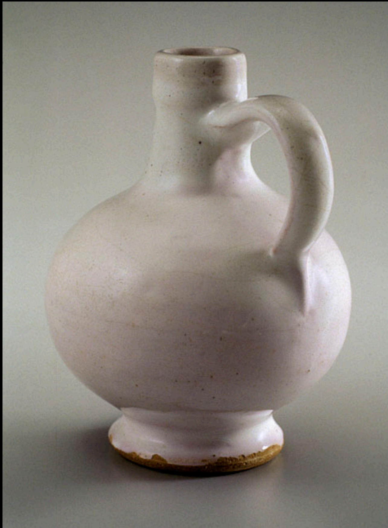
English Tin Glazed Earthenware Bottle from London c. 1650 (Chipstone Foundation)