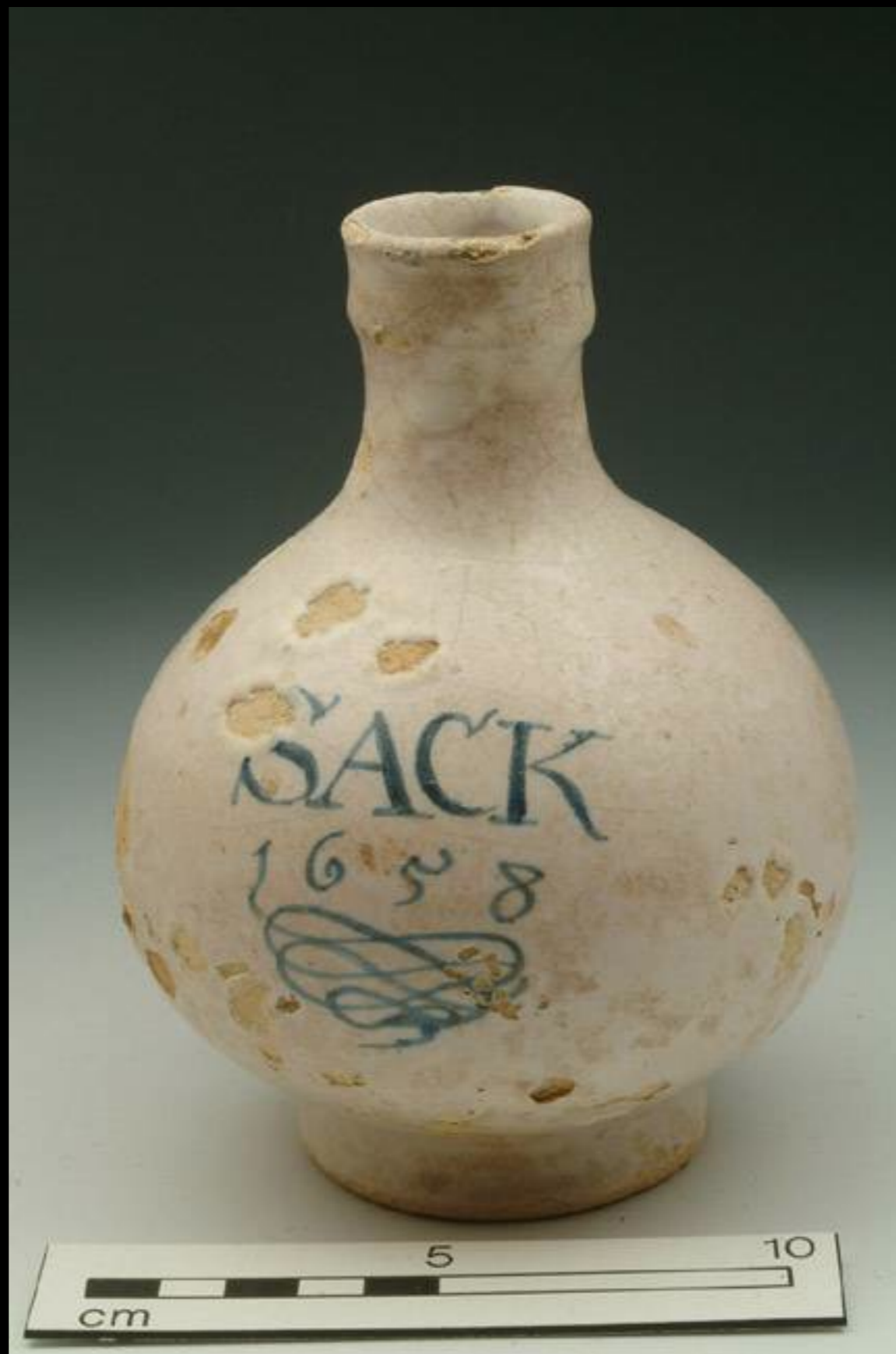
English or Dutch Tin Glazed Earthenware Sack Bottle 1658 (Museum of London)