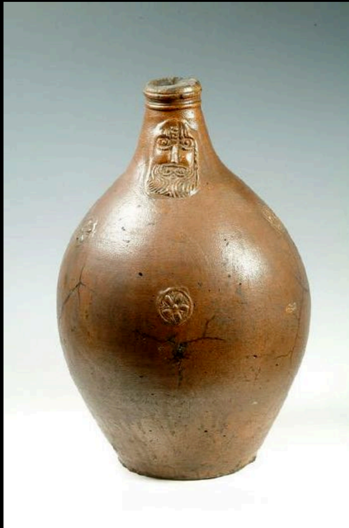
English Salt Glazed Stoneware Bellarmine Jug from London 17th Century (Museum of London)