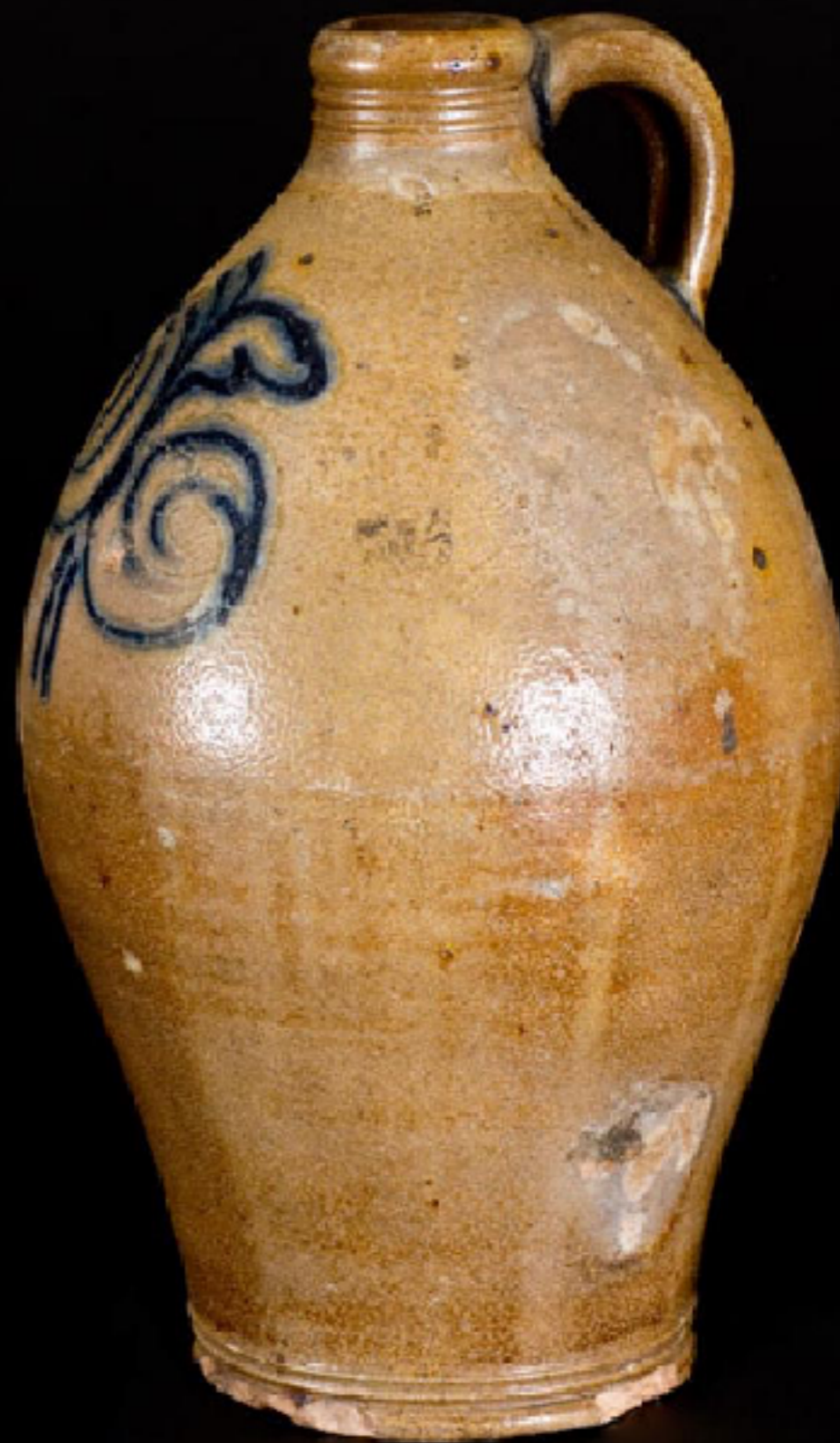
American 1/2 Gallon Stoneware Jug with Watchspring Decoration from Cheesequake, New Jersey, or Manhattan, New York c. 1775 (Crocker Farm Auction House)