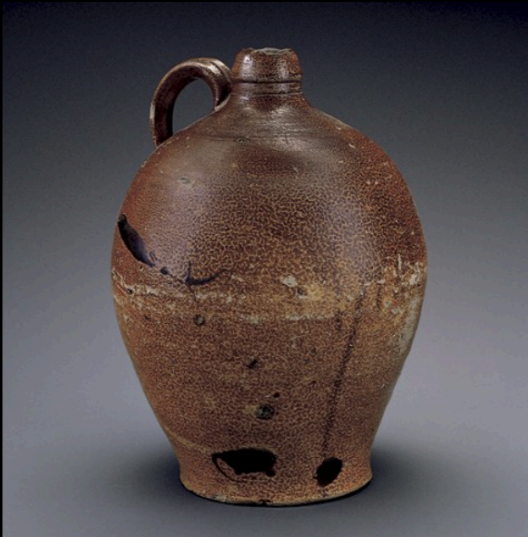
English Salt Glazed Stoneware Bottle from London