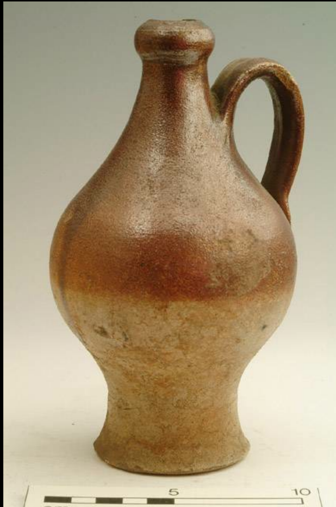
English Salt Glazed Stoneware Bottle from London c. 1671 - 1800