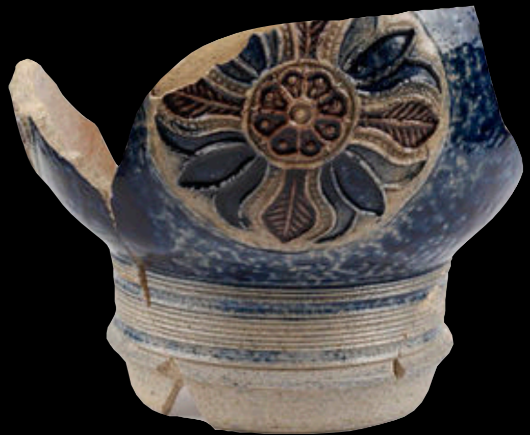
English Salt Glazed Stoneware Jug Shards from Fulham by John Dwight's Fulham Pottery c. 1680 (Victoria & Albert)