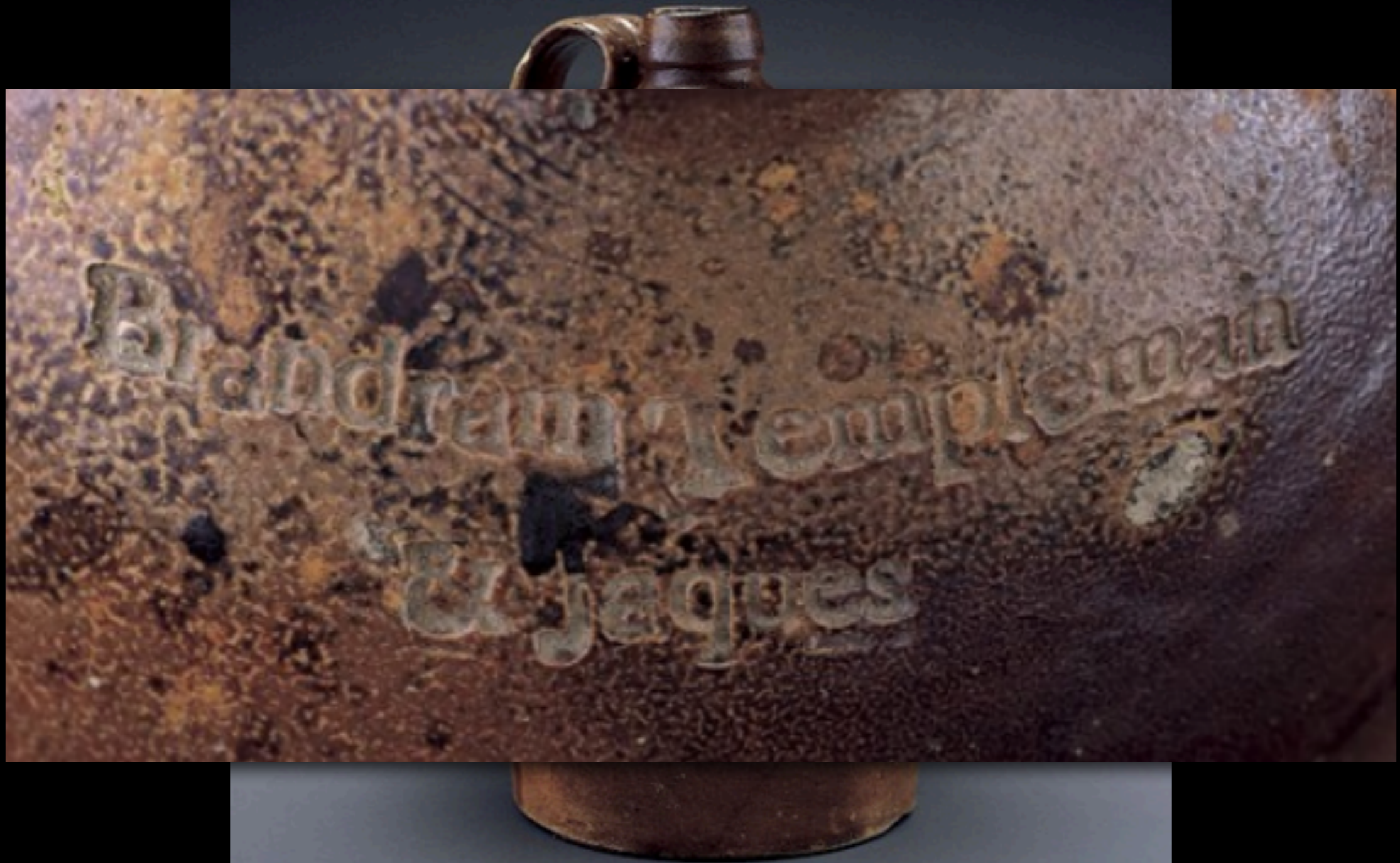
English Salt Glazed Stoneware Bottle from London, Probably Fulham by Brandram, Templeman & Jaques c. 1784 - 1805 (Chipstone)