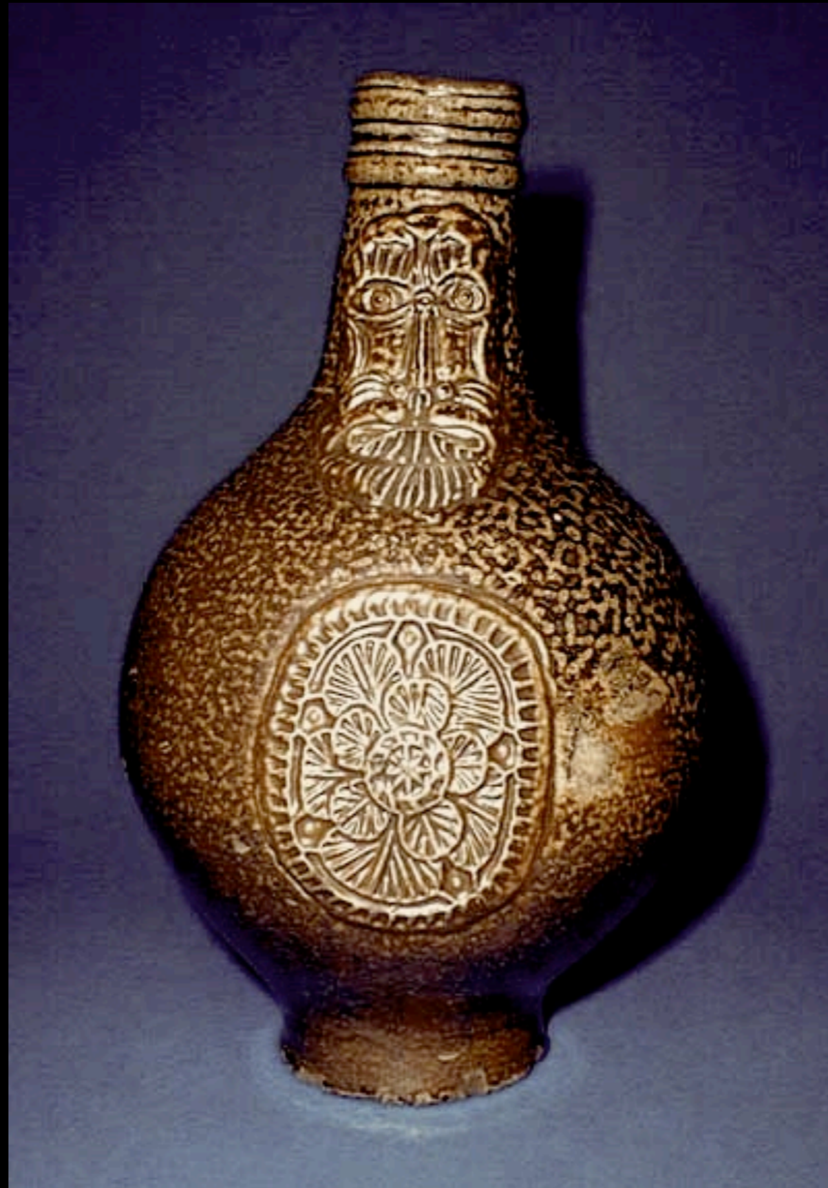
English Salt Glazed Stoneware Bellarmine Bottle from London 17th Century (Private Collection)