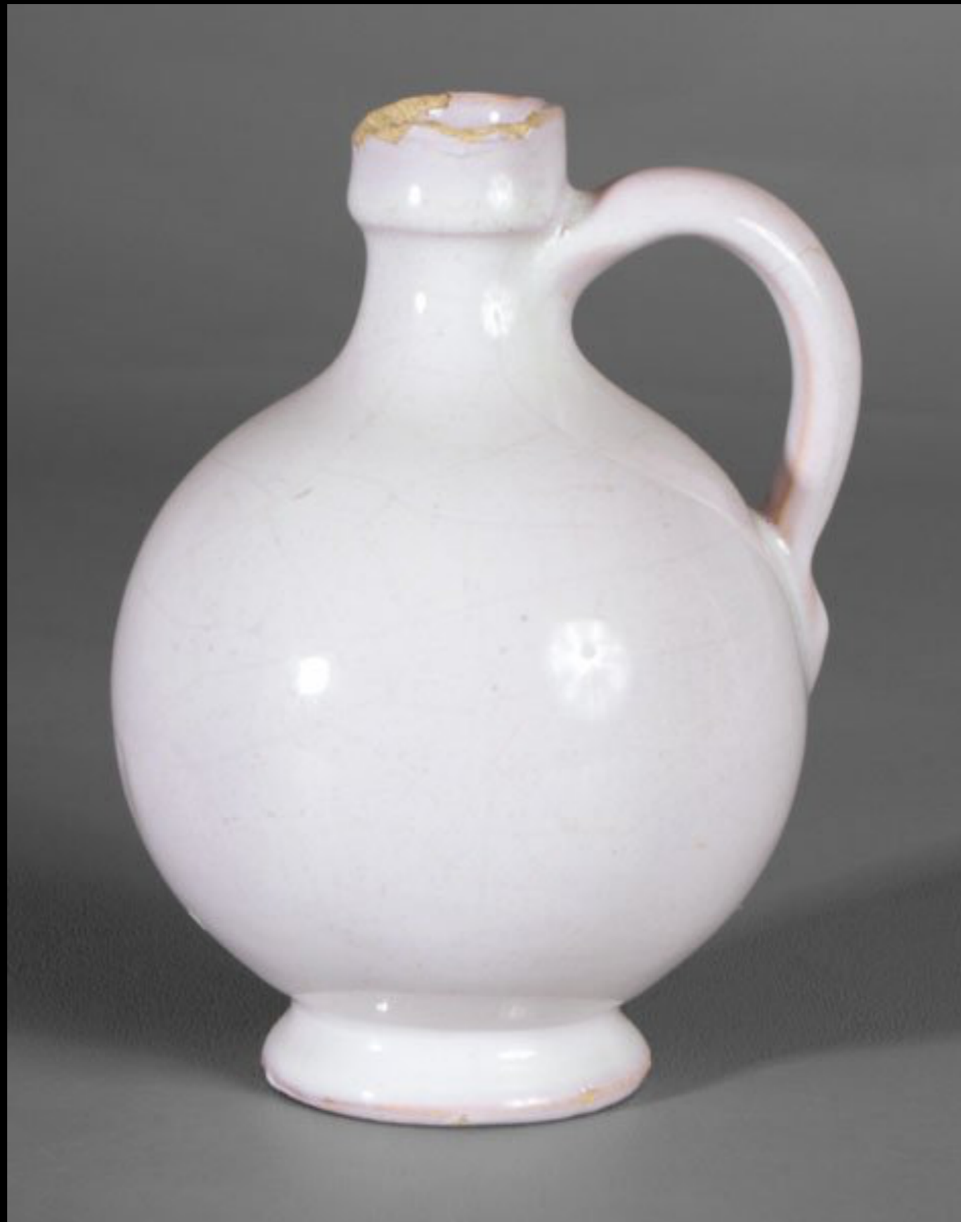
English or Dutch Tin Glazed Earthenware Bottle Mid - Late 17th Century (Brunk Auctions)