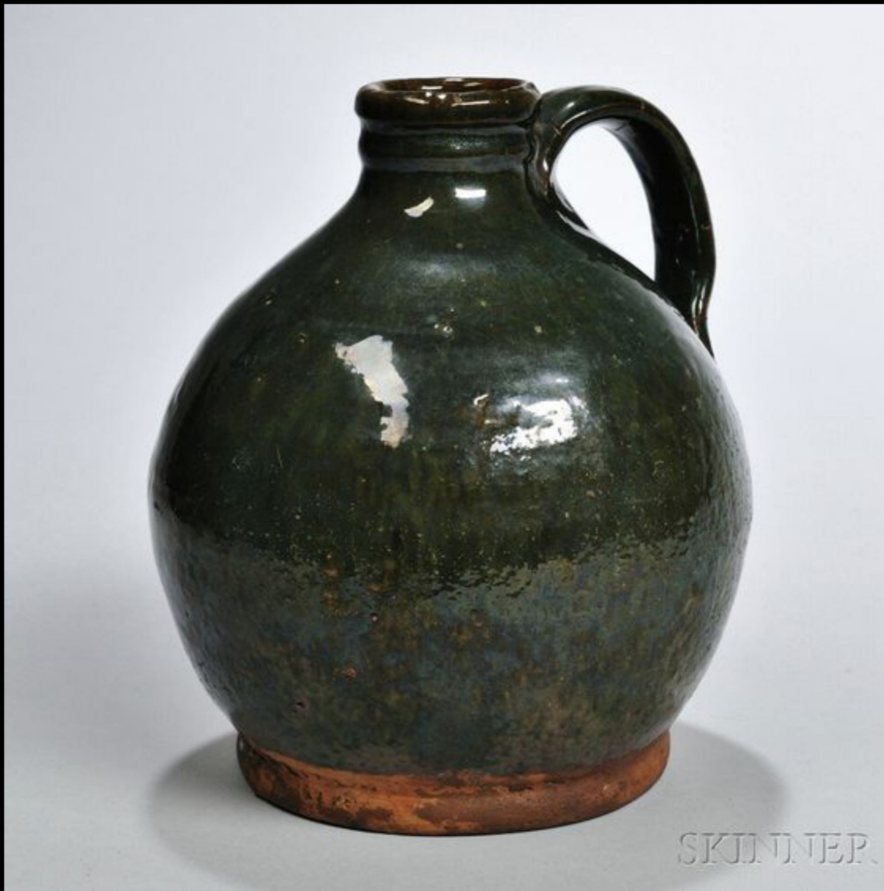
American Lead Glazed Earthenware Jug Made by the Upton Brothers of East Greenwich, Rhode Island Late 18th Century (Skinner)