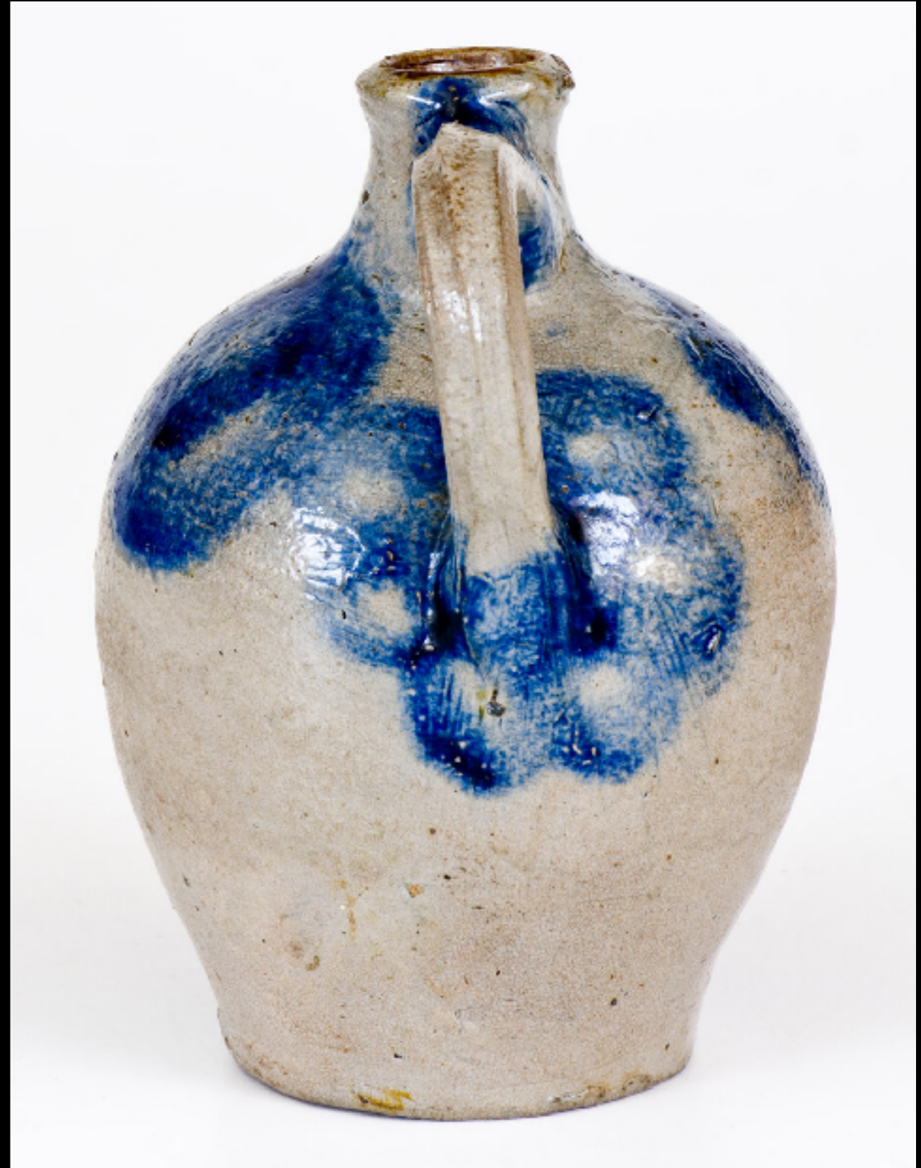
American Stoneware Miniature Jug from Ringoes, New Jersey Attributed to Kemple Pottery c. 1745 - 1790