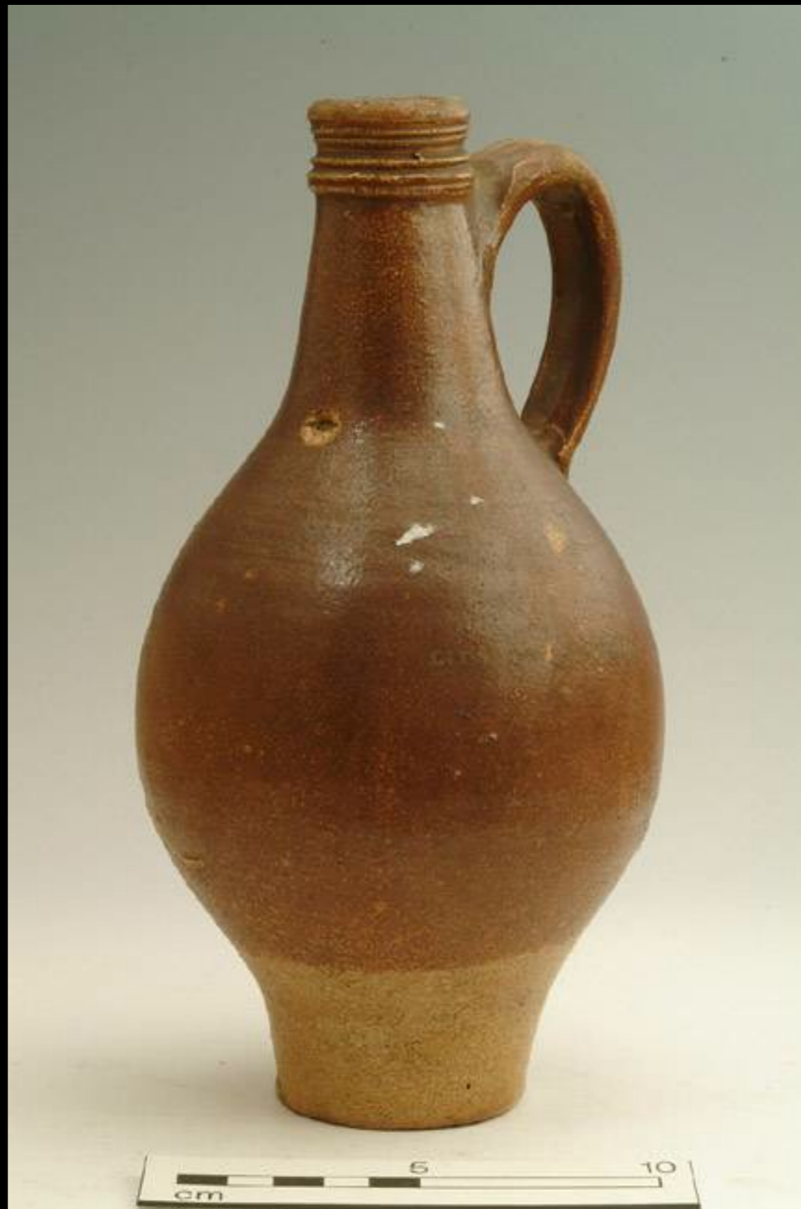
English Salt Glazed Stoneware Bottle from London c. 1671 - 1800 (Museum of London)