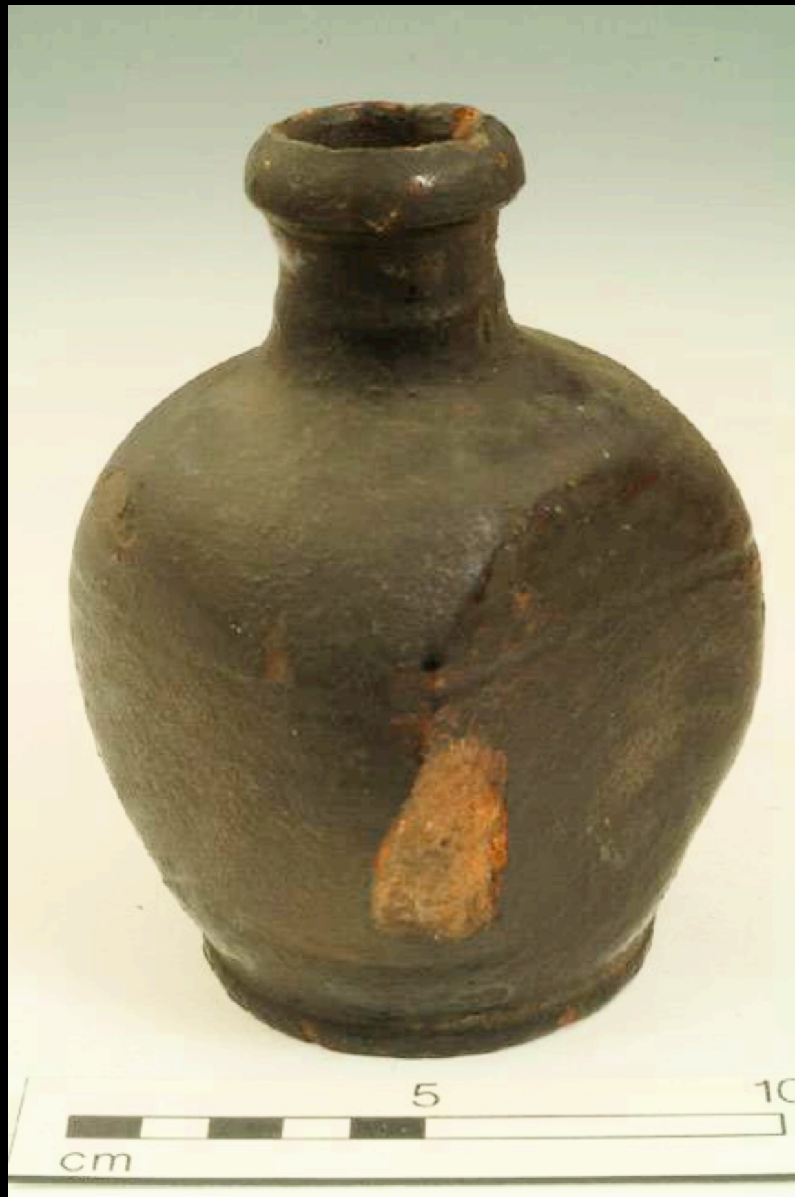
English Lead Glazed Earthenware Bottle from Harlow, Essex c. 1580 - 1700 (Museum of London)