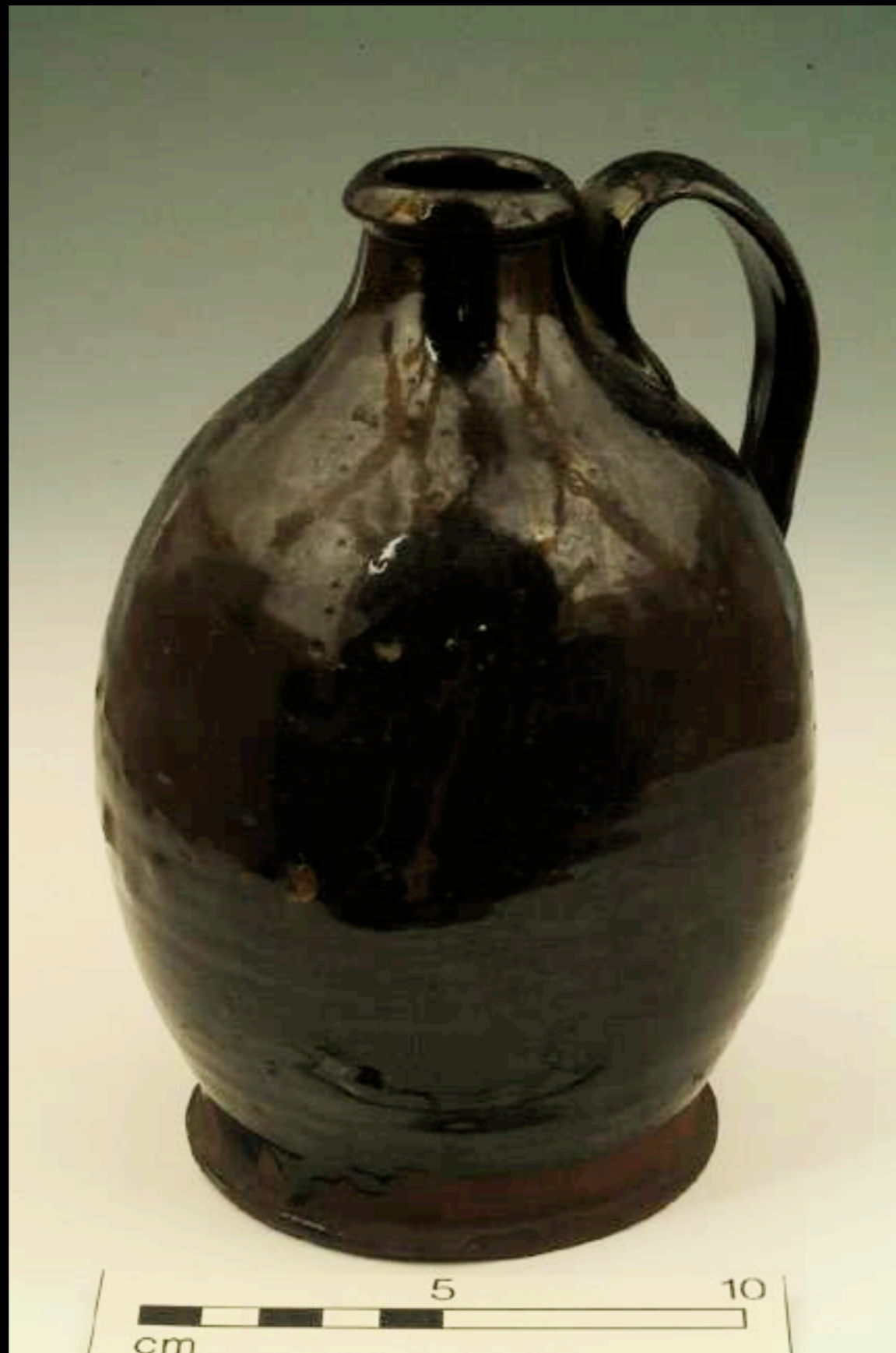
English Lead Glazed Earthenware Bottle c. 1601 - 1700 (Museum of London)