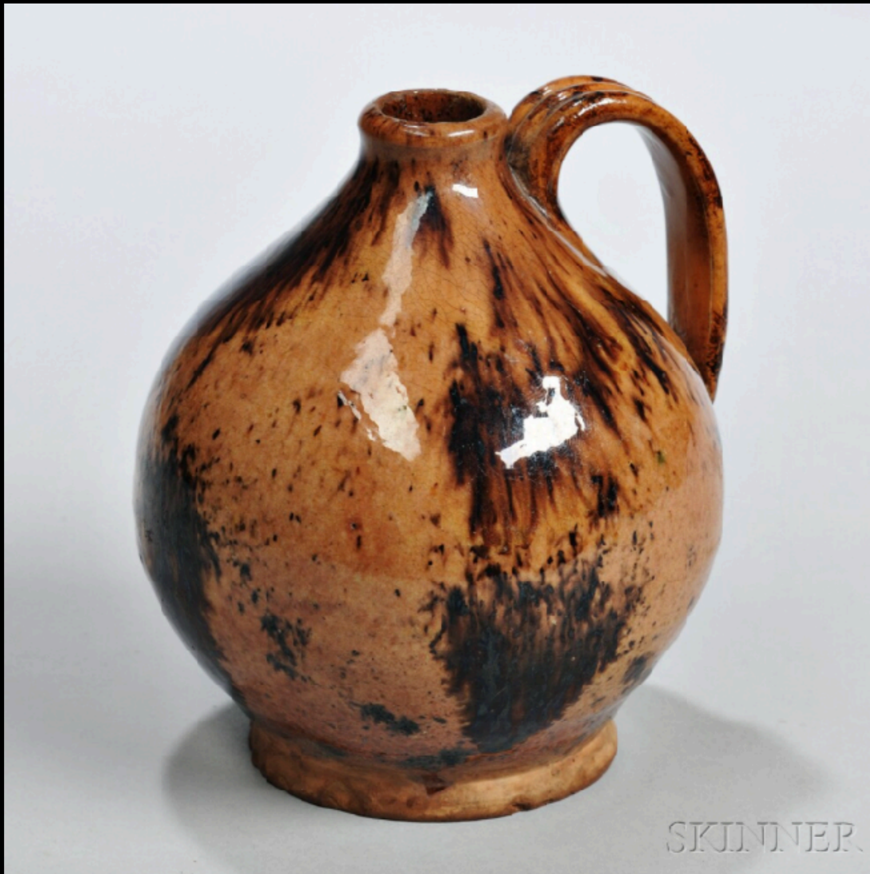
American Lead Glazed Earthenware Jug from Bristol County, Massachusetts Late 18th - Early 19th Century (Skinner)