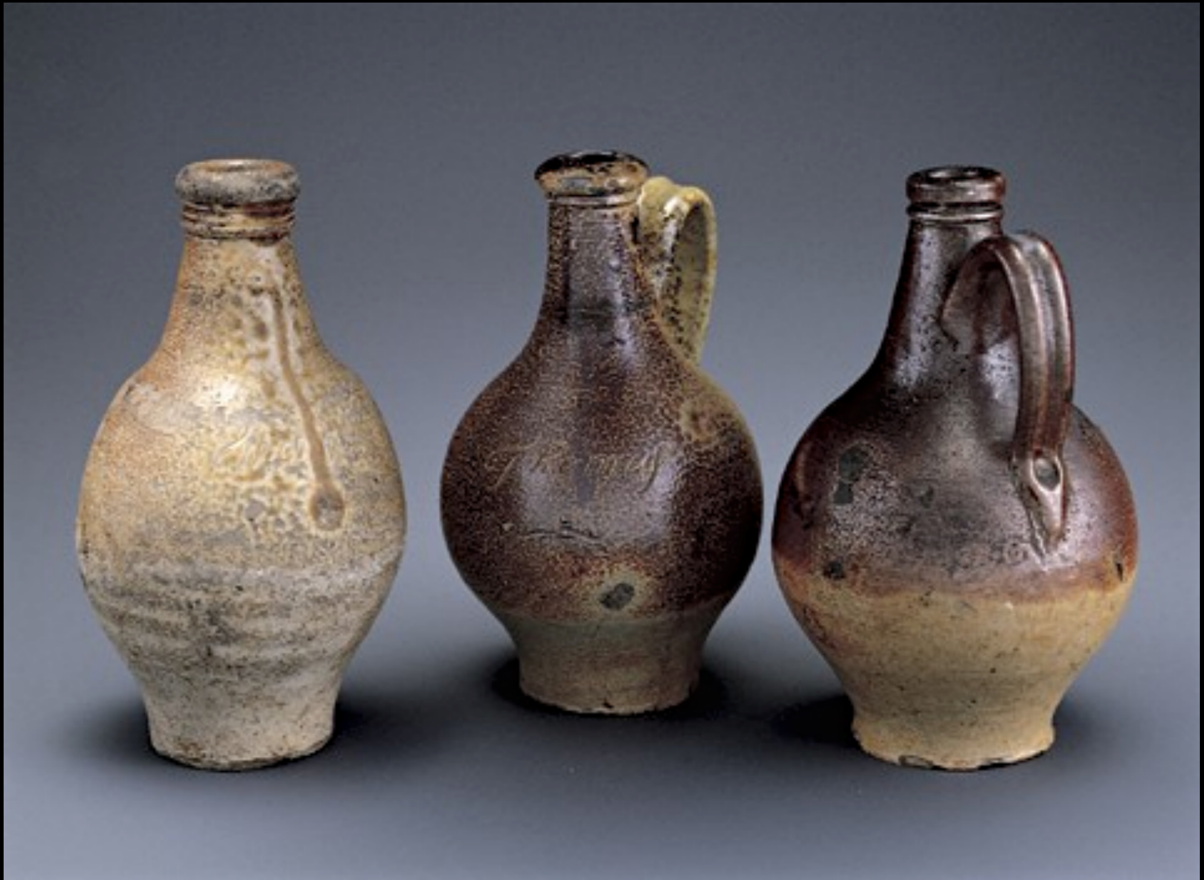
English Salt Glazed Stoneware Bottles, Probably from London c. 1690 - 1720