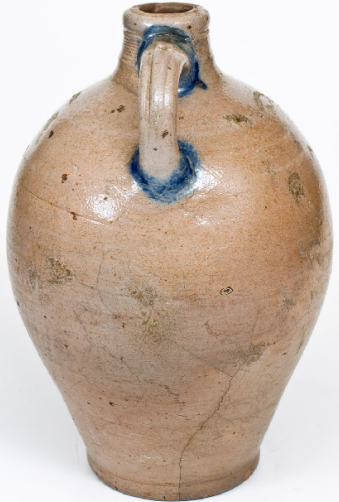
American 2 Gallon Stoneware Jug with Watchspring Decoration from Manhattan, NY or Cheesequake, NJ c. 1775 (Crocker Farm Auction House)