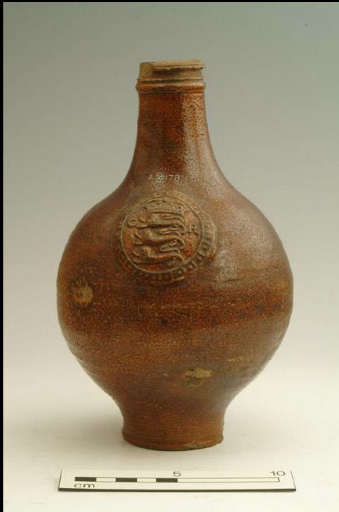
English Salt Glazed Stoneware Bottle with Medallion from Fulham / Hammersmith, London c. 1671 - 1703 (Museum of London)