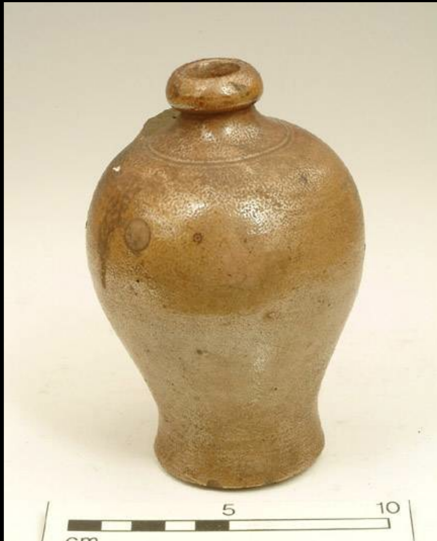
English Salt Glazed Stoneware Bottle from Fulham / Hammersmith, London c. 1701 - 1800 (Museum of London)