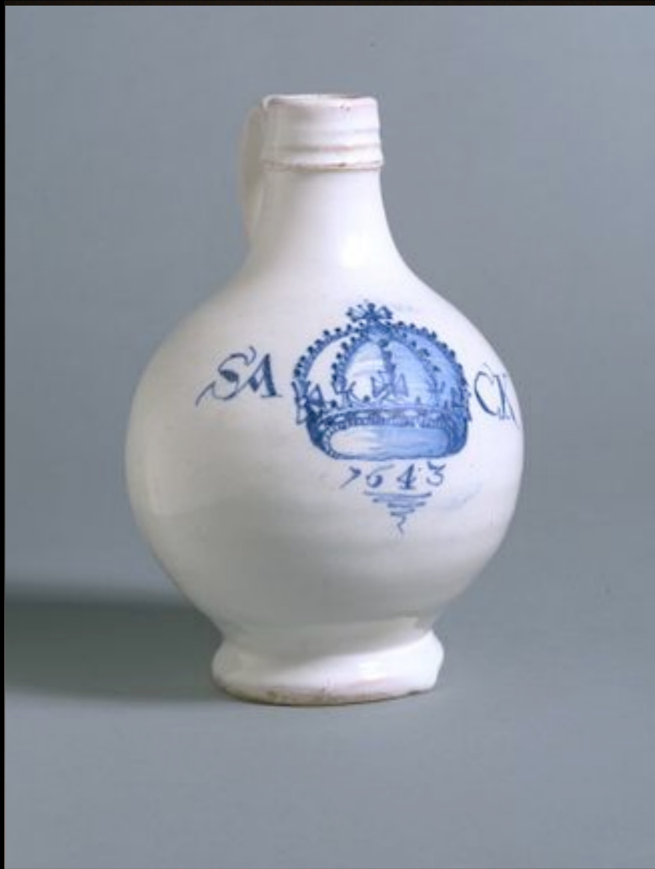
English or Dutch Tin Glazed Earthenware Sack Bottle