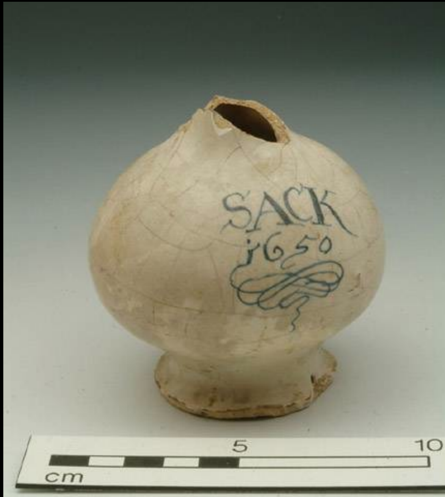
English or Dutch Tin Glazed Earthenware Sack Bottle 1650 (Museum of London)