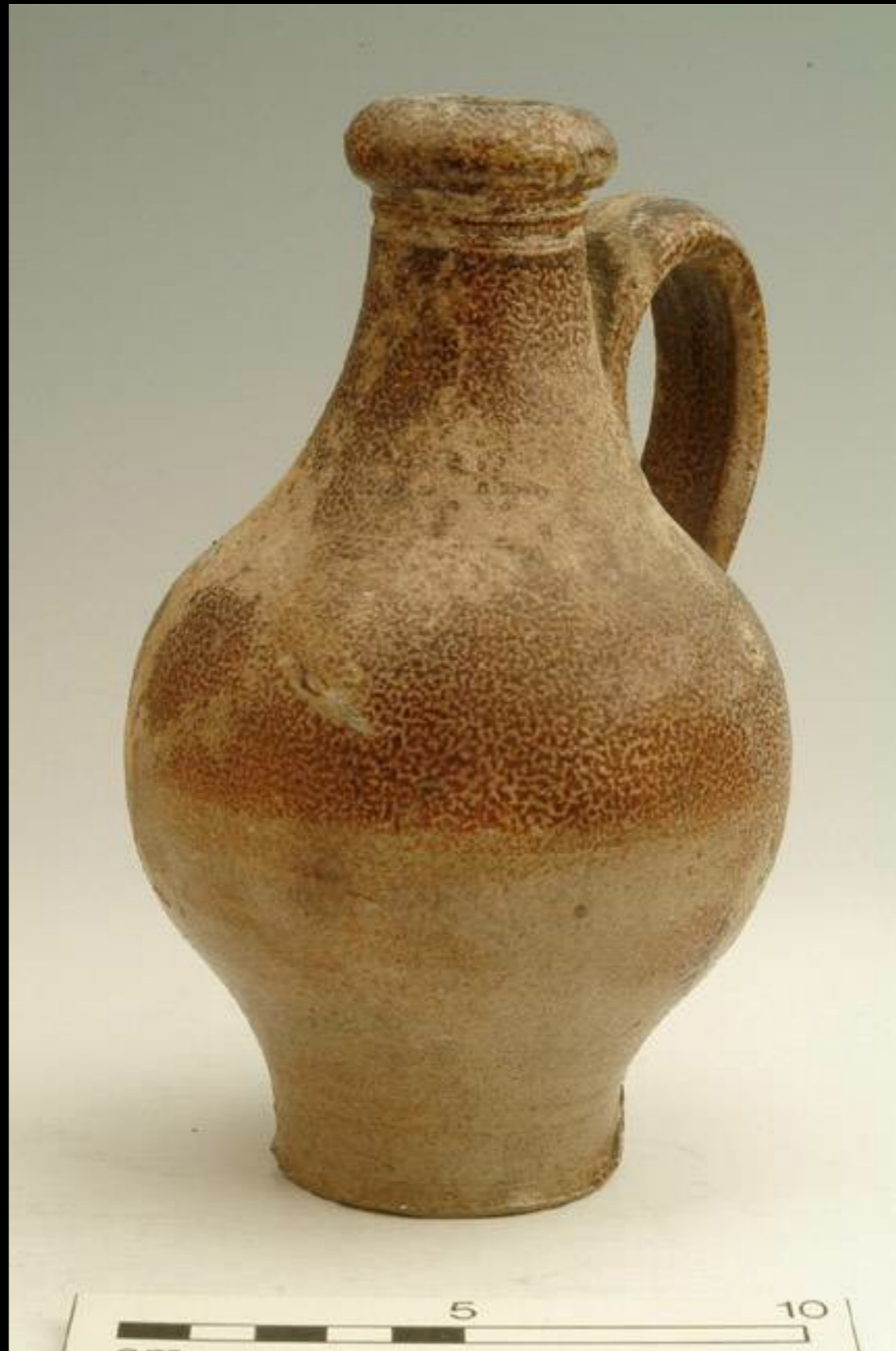
English Salt Glazed Stoneware Bottle from Fulham / Hammersmith, London c. 1671 - 1703 (Museum of London)