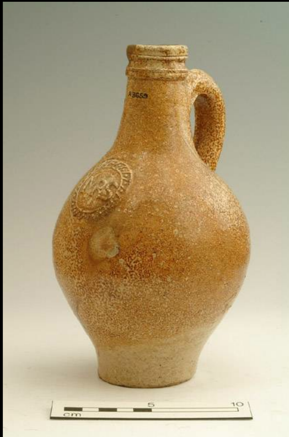
English Salt Glazed Stoneware Bottle with Medallion Inscribed "MRS" from Fulham / Hammersmith, London c. 1671 - 1703 (Museum of London)