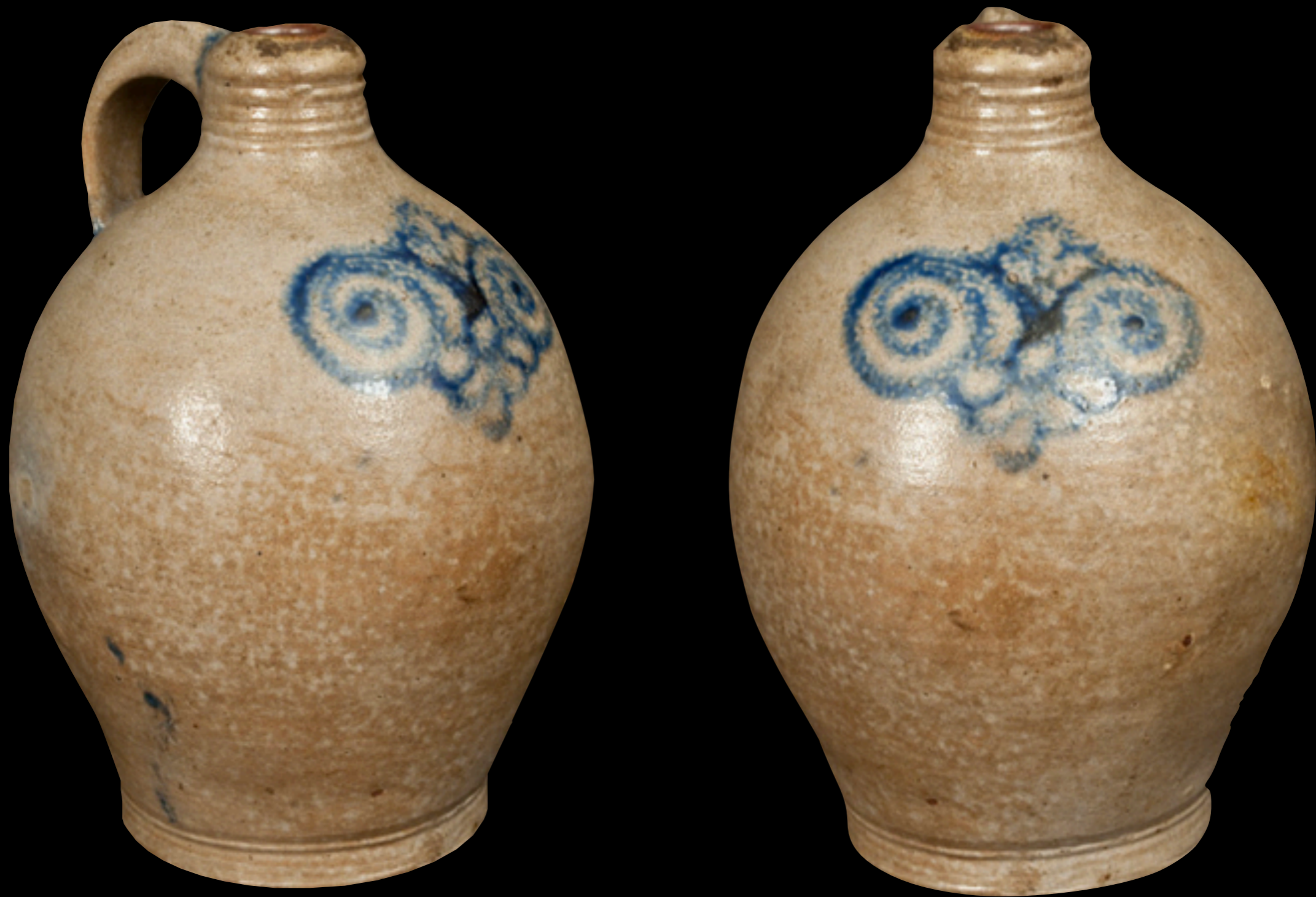
American 1 Gallon Stoneware Jug with Watchspring Decoration from Cheesequake, New Jersey, or Manhattan, New York c. 4th Quarter 18th Century (Crocker Farm Auction House)