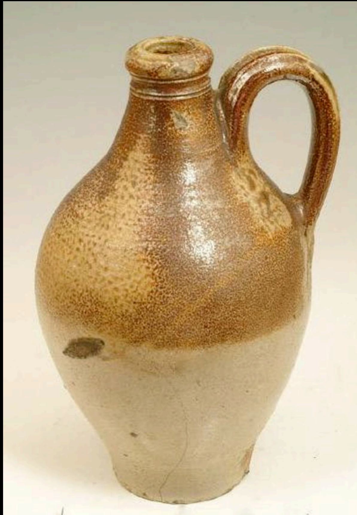
English Salt Glazed Stoneware Bottle from Fulham / Hammersmith, London c. 1701 - 1800 (Museum of London)