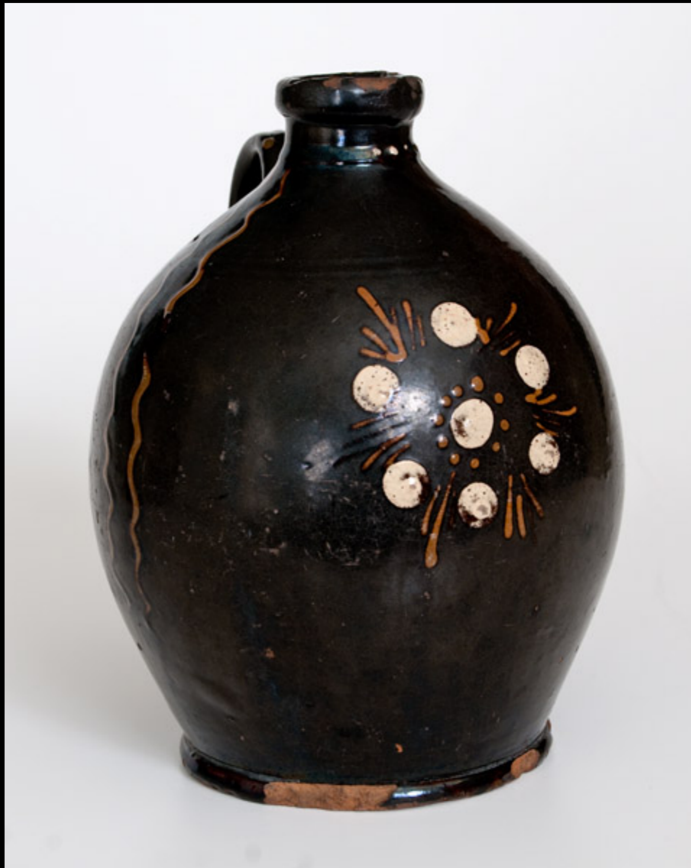
American Lead Glazed Earthenware Jug from Alamance County, North Carolina Late 18th - Early 19th Century (Crocker Farm)