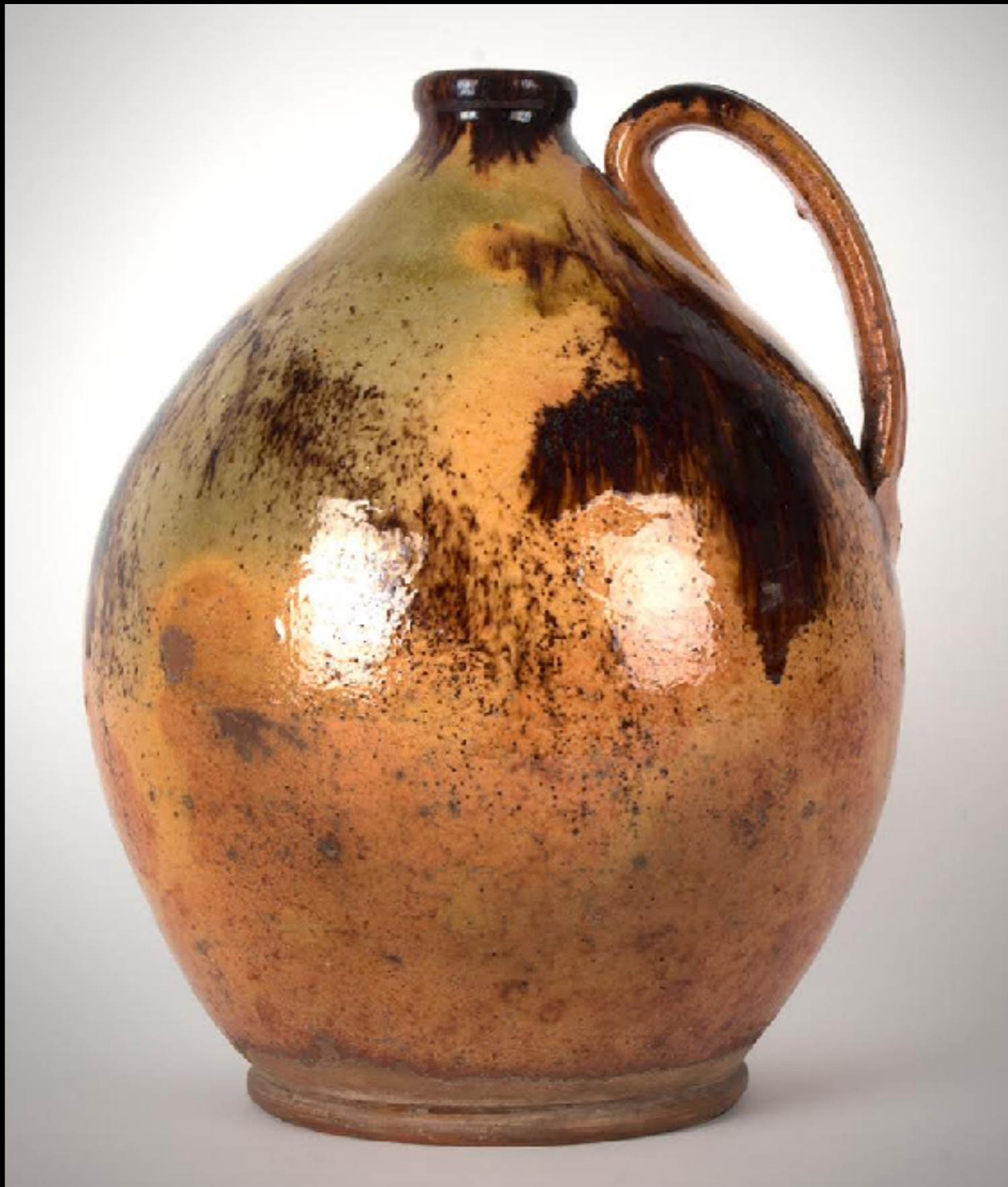
American Lead Glazed Earthenware Jug from Southeastern Massachusetts c. 1780 - 1820