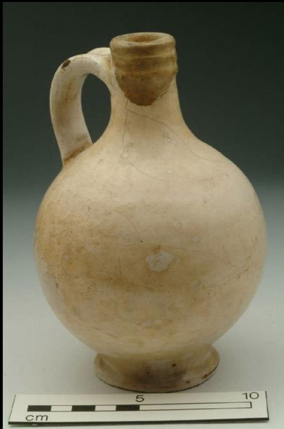
English or Dutch Tin Glazed Earthenware Bottle 1650 (Museum of London)