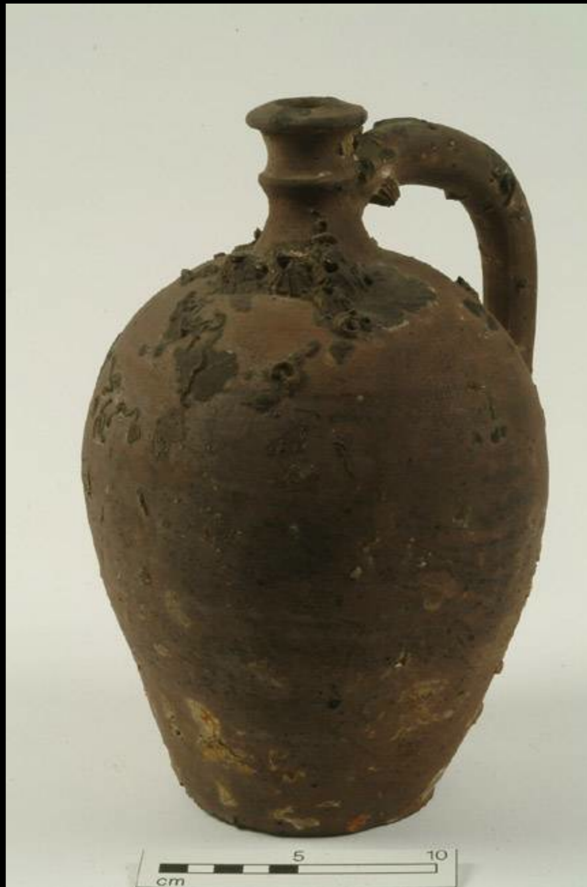
Brown Stoneware Bottle - Found in England - Unknown Origin (Possibly Mediterranean) c. 1701 - 1800 (Museum of London)