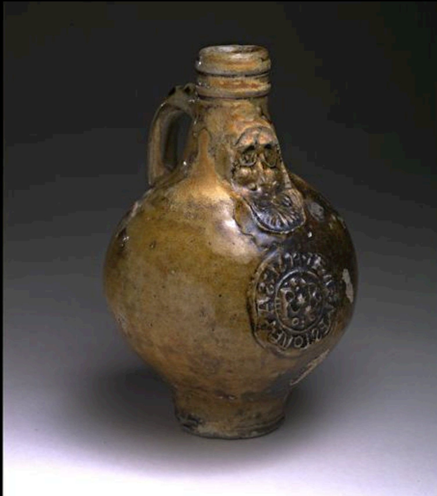
English Salt Glazed Stoneware Bellarmine Jug from Southampton