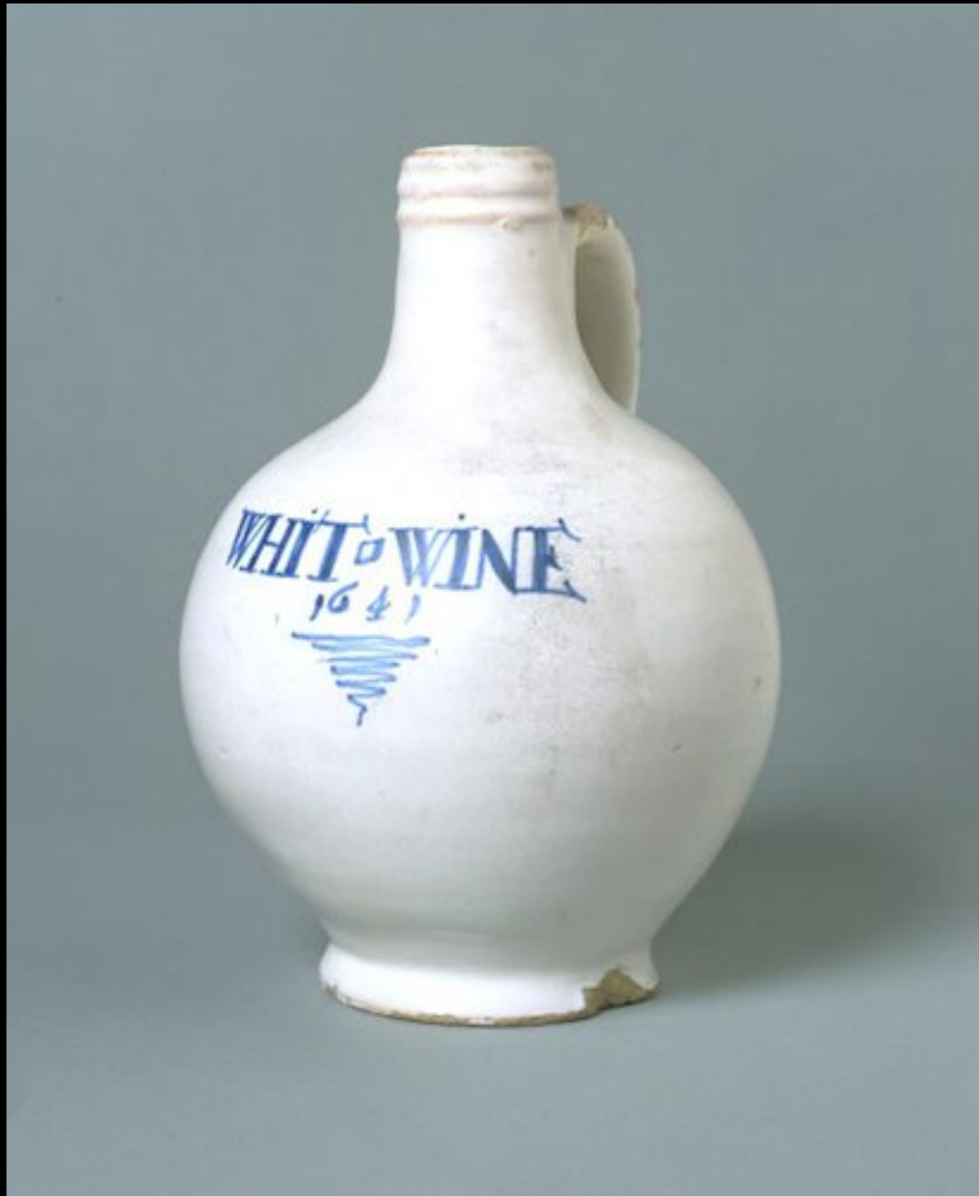
English or Dutch Tin Glazed Earthenware Whit Wine Bottle