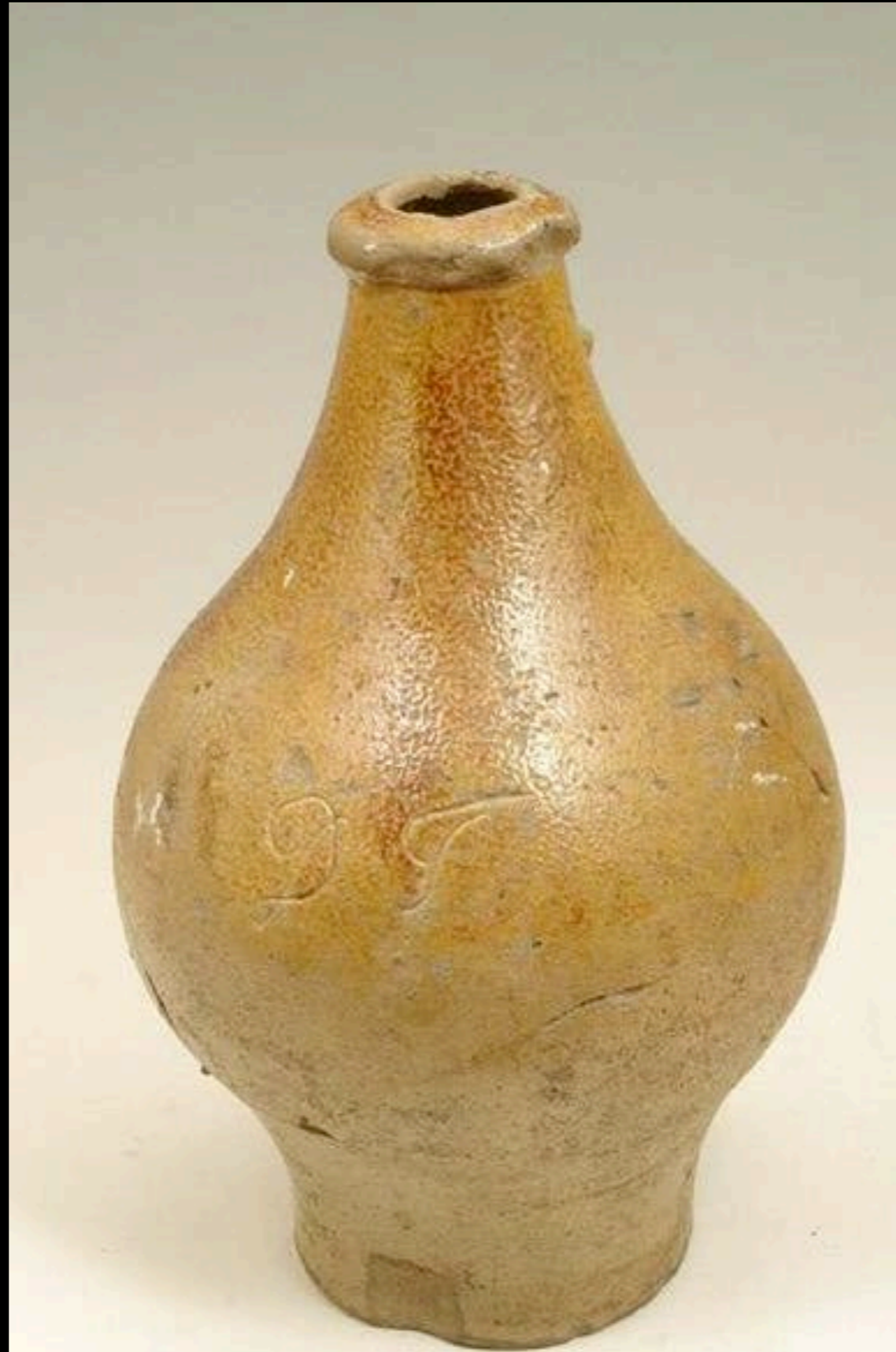
English Salt Glazed Stoneware Bottle Inscribed "DJ" from Fulham, London c. 1701 - 1800 (Museum of London)