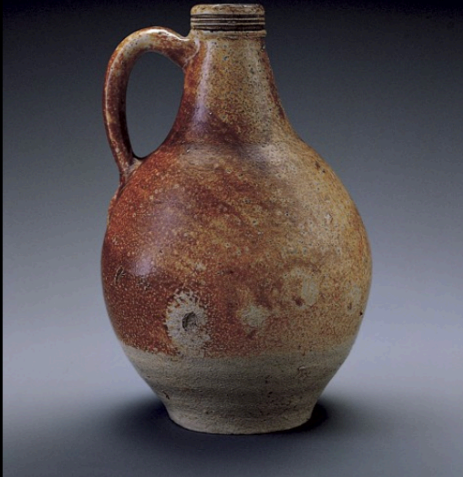
English Salt Glazed Stoneware Bottle from London c. 1725 (Chipstone)