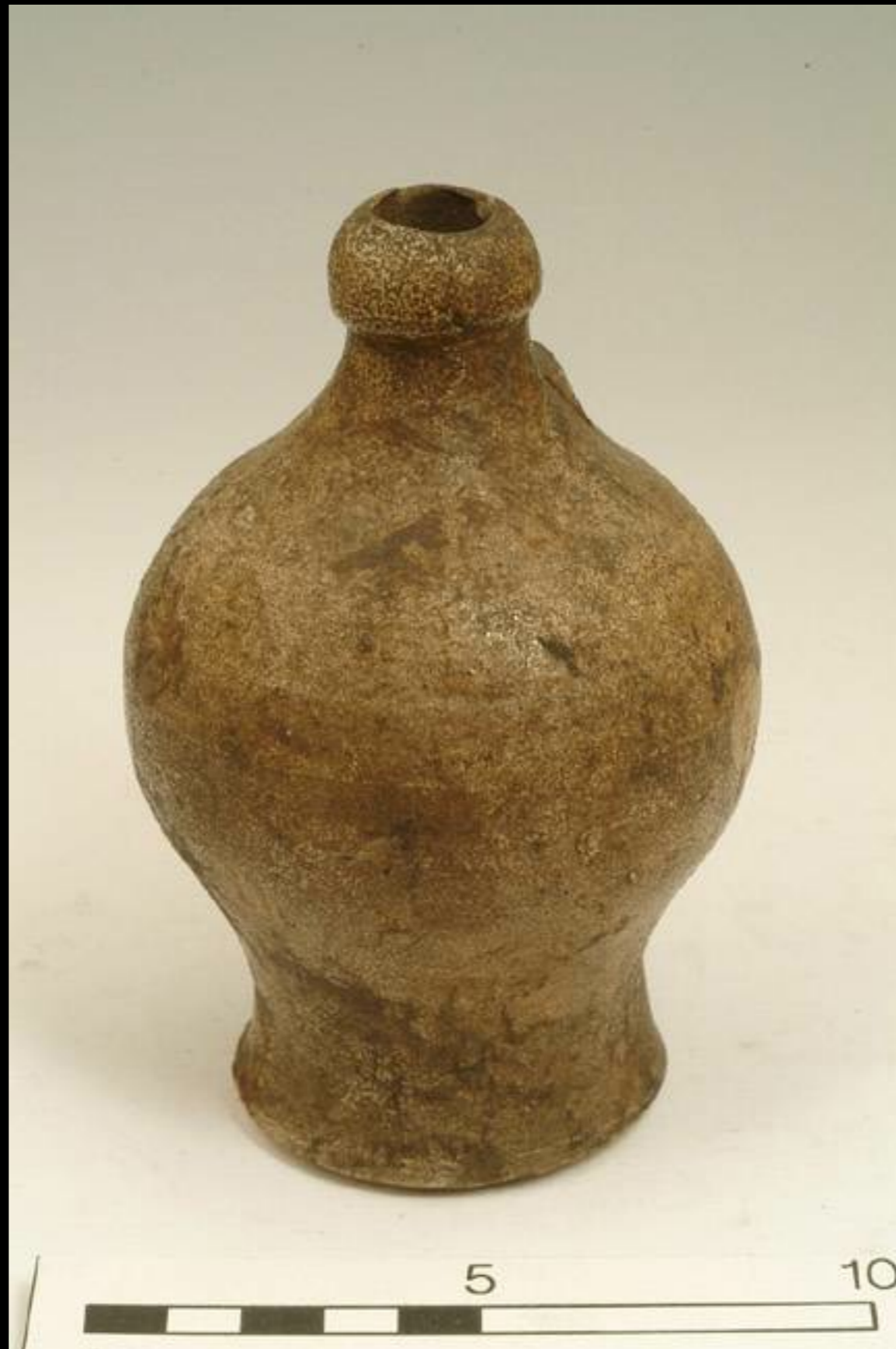
English Salt Glazed Stoneware Bottle from Fulham / Hammersmith, London c. 1701 - 1800 (Museum of London)