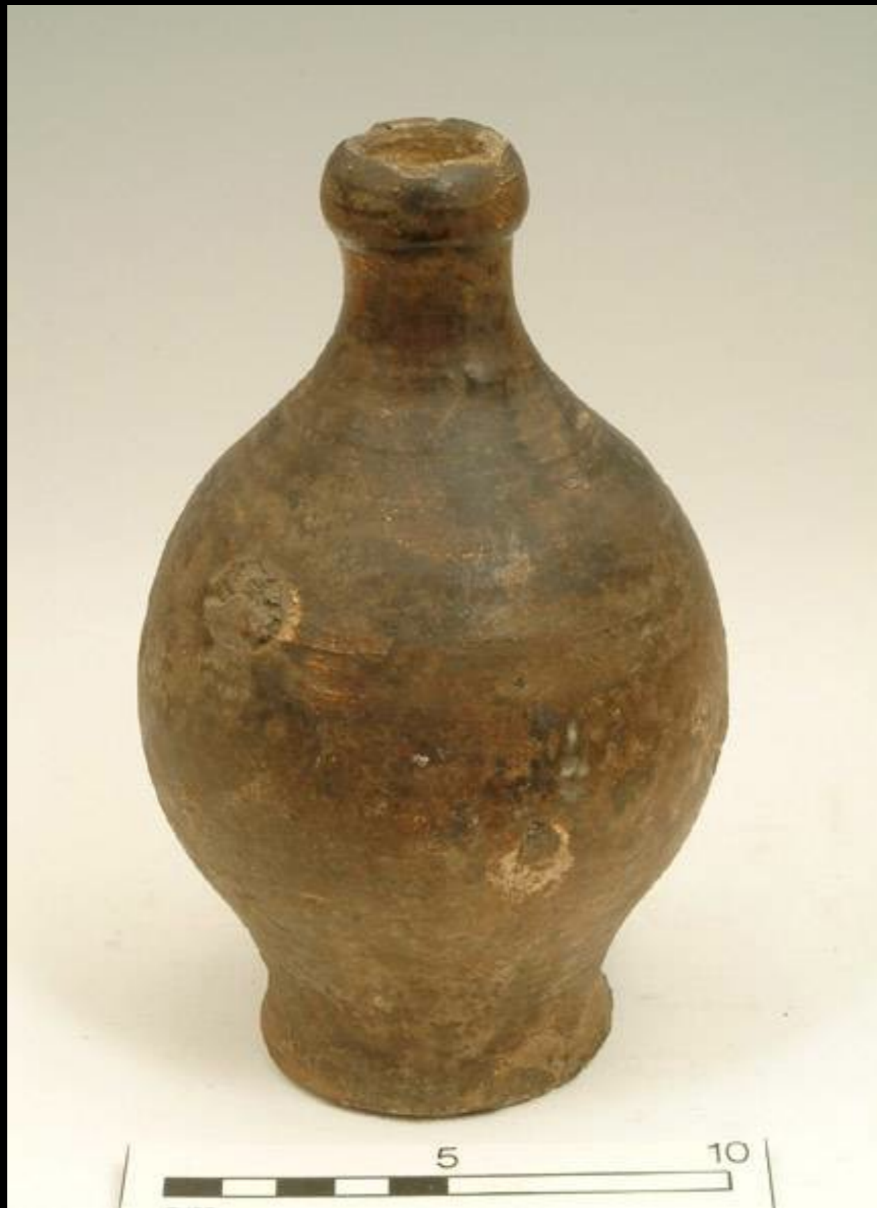
English Salt Glazed Stoneware Bottle from Fulham / Hammersmith, London c. 1700 (Museum of London)