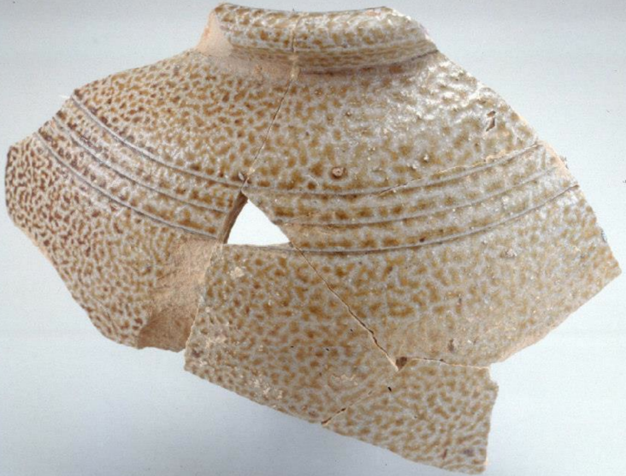
Brown Salt-glazed Stoneware Jug Excavated at Yorktown, Virginia c. 1720 - 1740 (Ceramics in America)