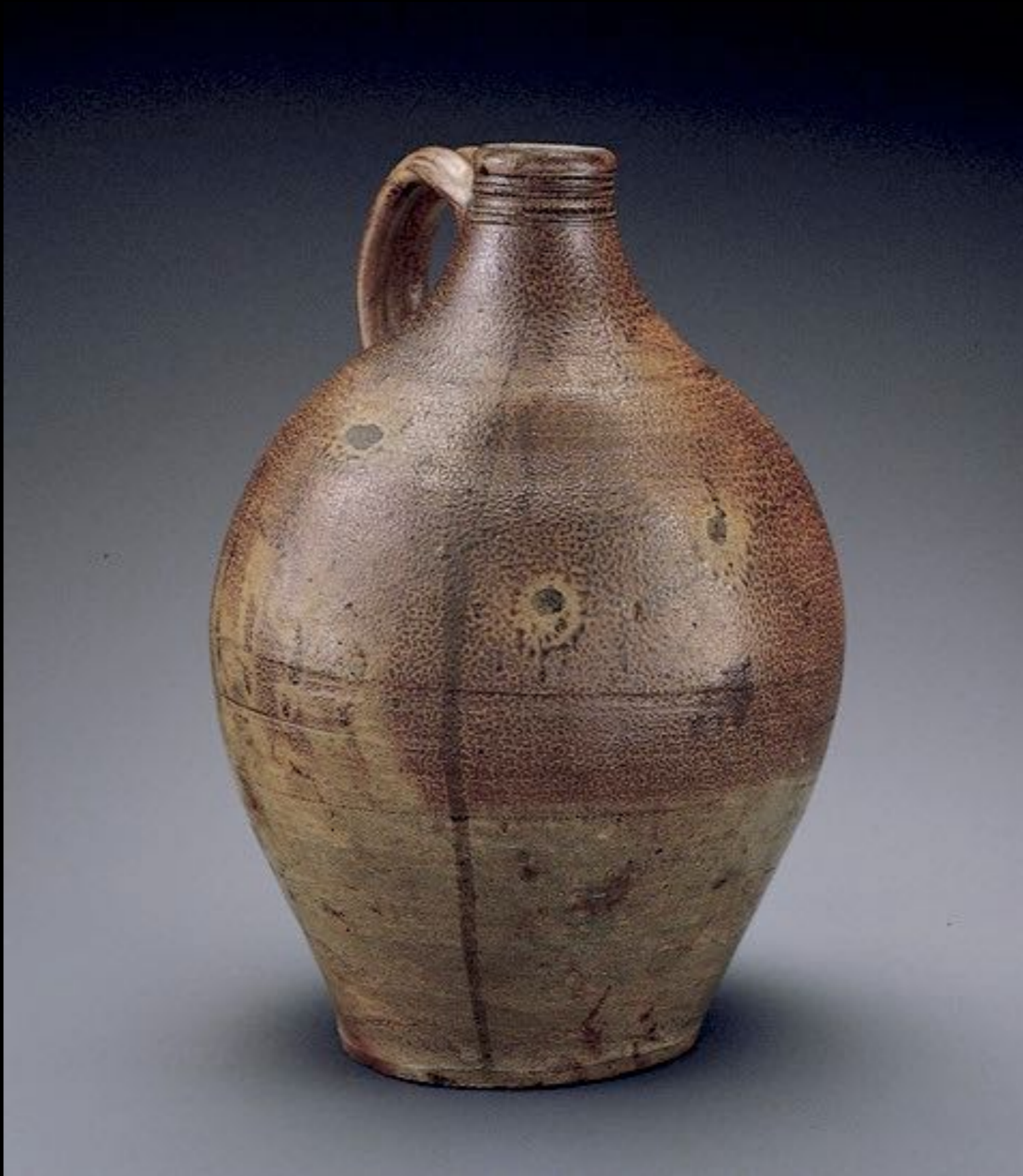
English Salt Glazed Stoneware Bottle from London, Probably Fulham