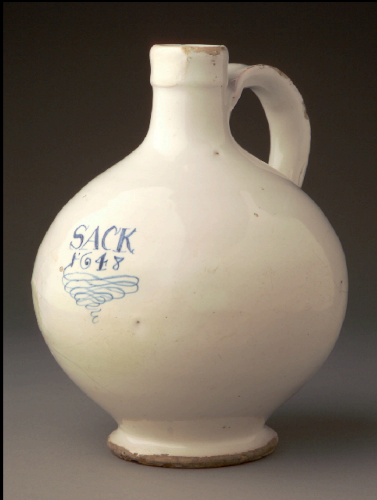
English or Dutch Tin Glazed Earthenware Sack Bottle