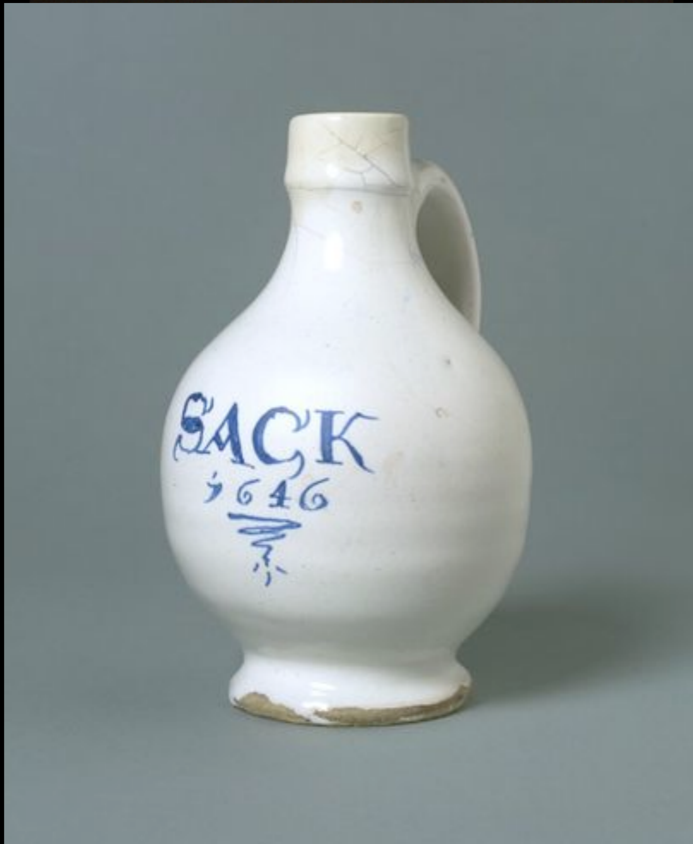
English or Dutch Tin Glazed Earthenware Sack Bottle