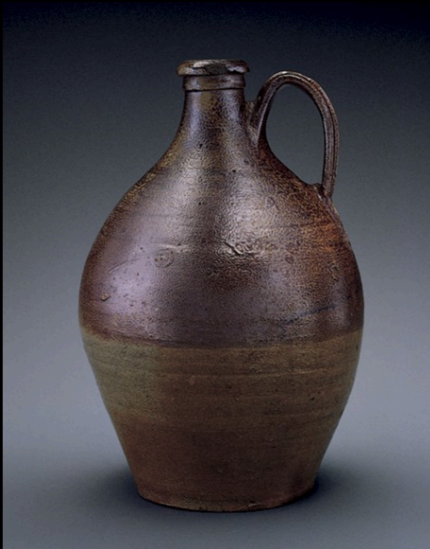
English Salt Glazed Stoneware Bottle from London, Probably Fulham