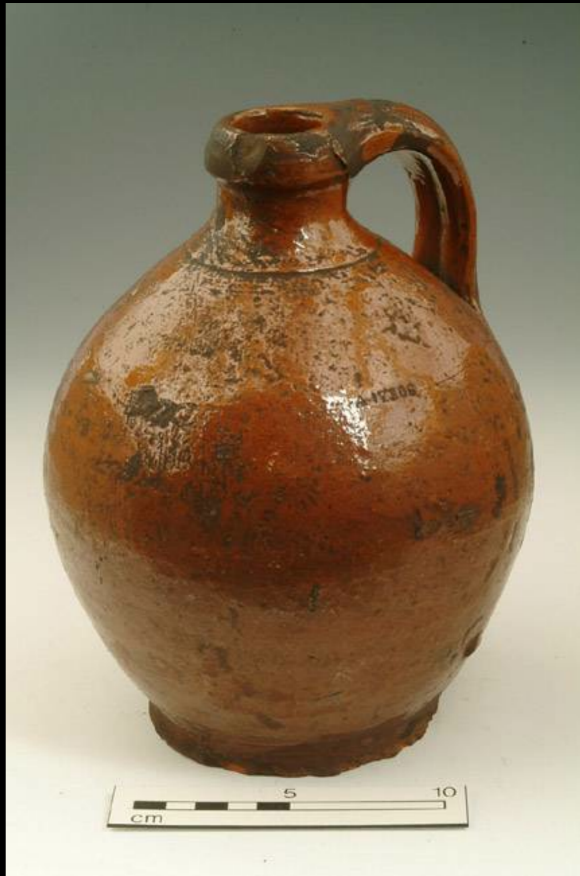
English Lead Glazed Earthenware Bottle from London c. 1580 - 1700 (Museum of London)