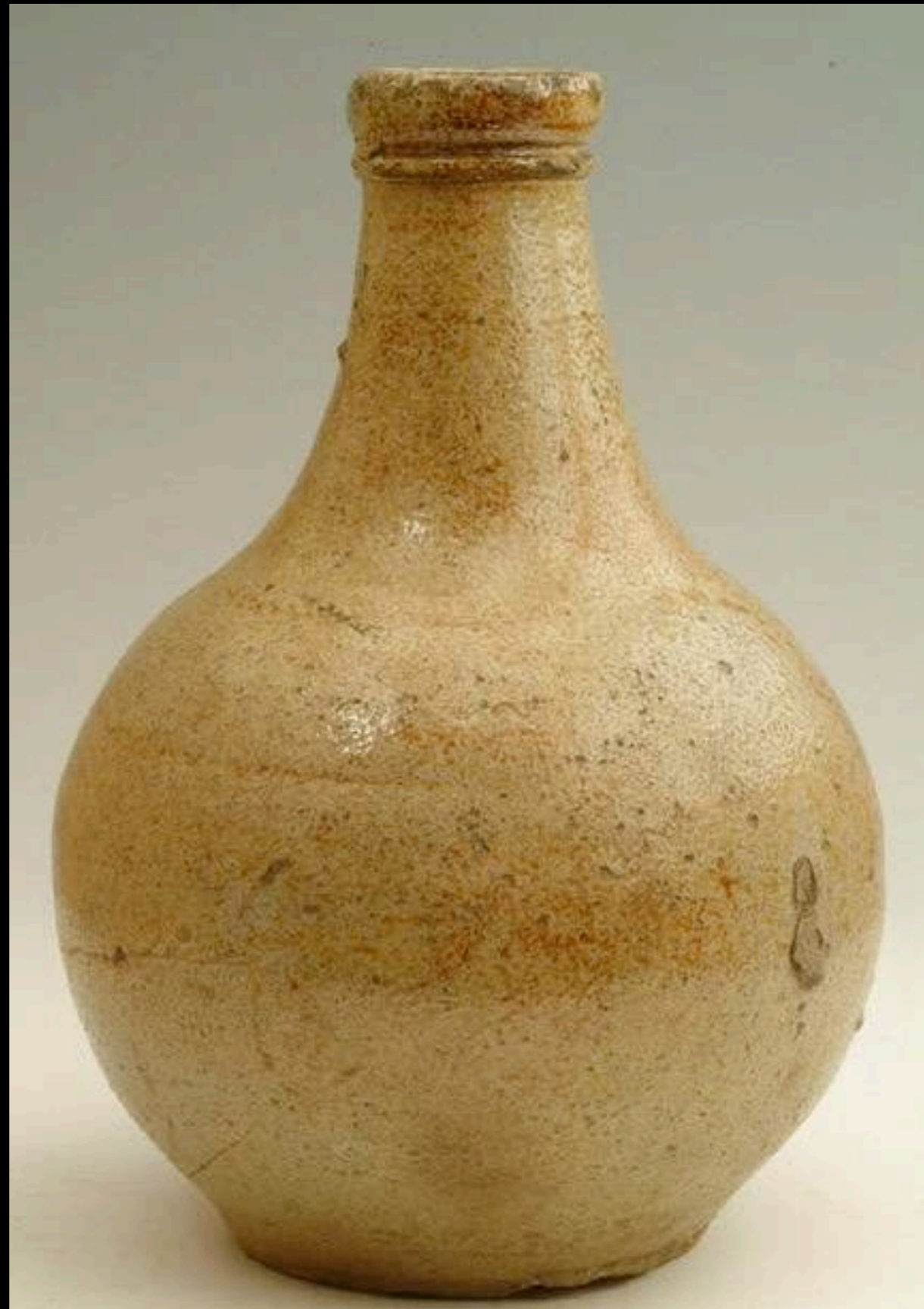
English Salt Glazed Stoneware Bottle from Fulham / Hammersmith, London c. 1671 - 1703 (Museum of London)