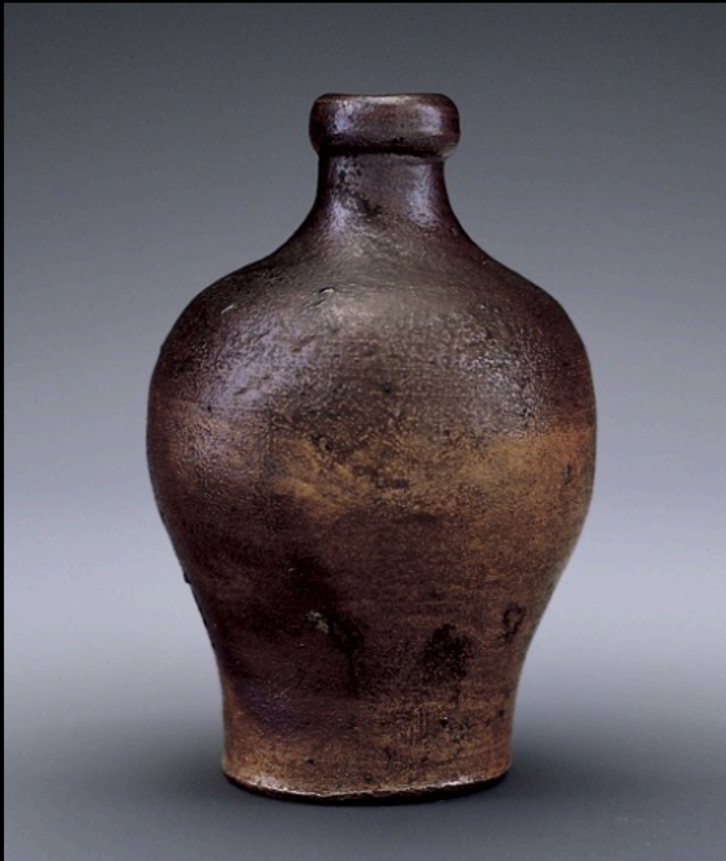
English Salt Glazed Stoneware Bottle from London, Probably Fulham Reported to Have Been Found in a Connecticut Cellar c. 1780 (Chipstone)