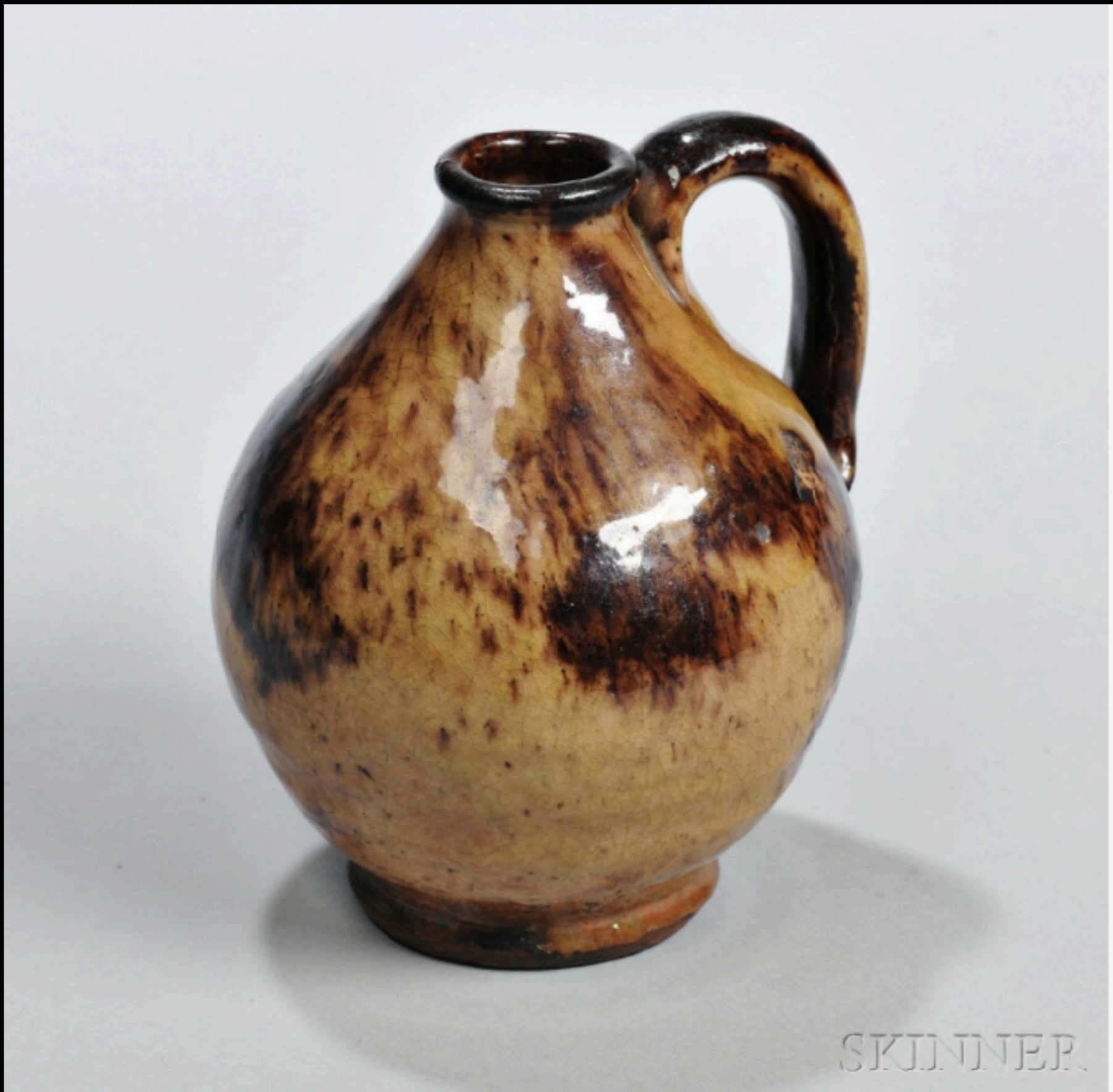
American Lead Glazed Earthenware Jug from Bristol County, Massachusetts Late 18th - Early 19th Century (Skinner)