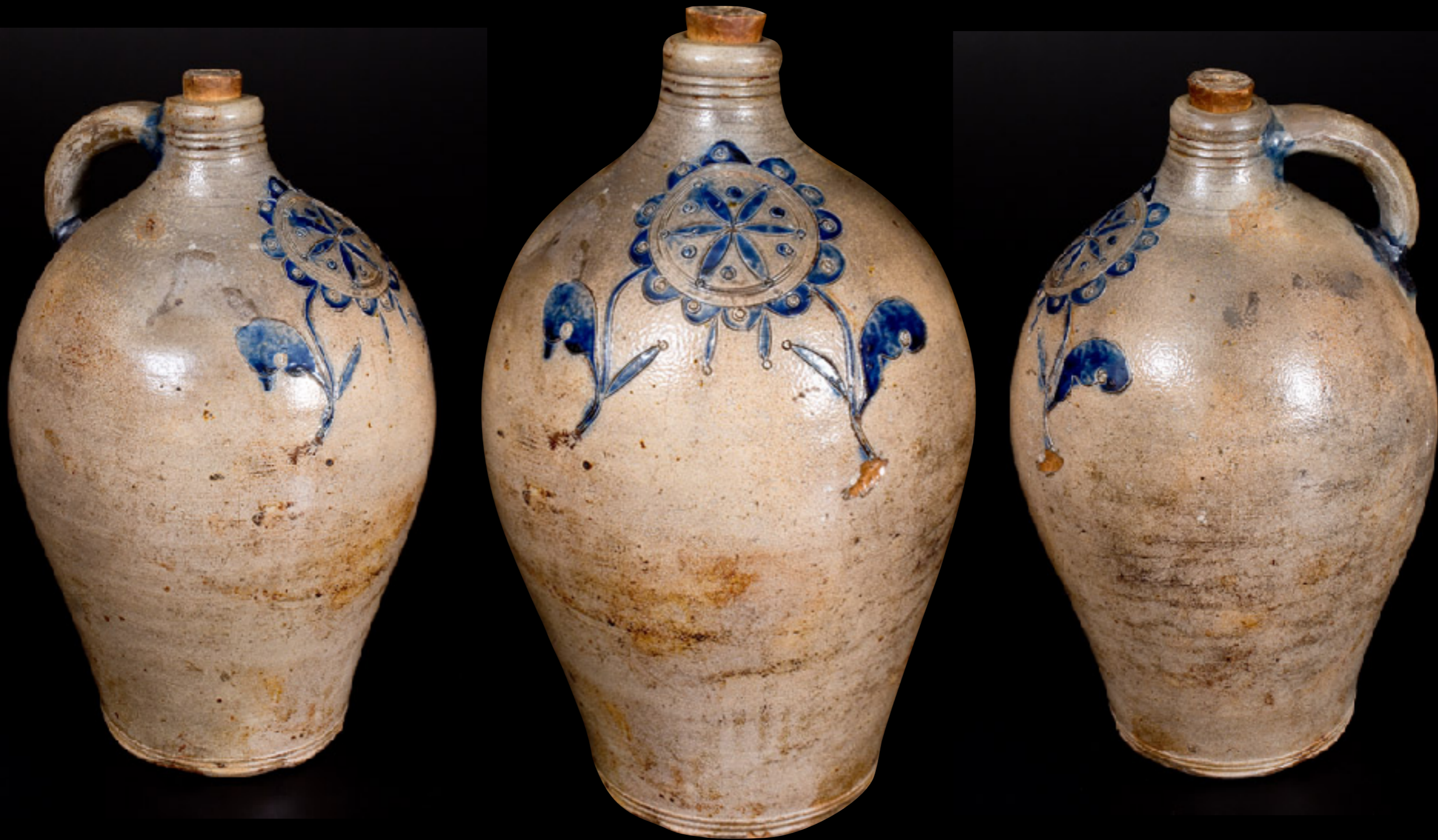
American 2 Gallon Stoneware Jug from Manhattan, New York c. Late 18th Century (Crocker Farm Auction House)