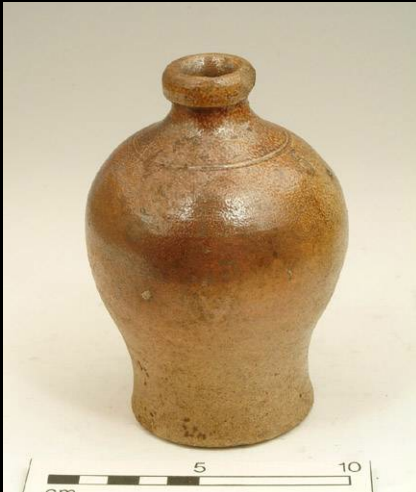
English Salt Glazed Stoneware Bottle from Fulham / Hammersmith, London c. 1701 - 1800 (Museum of London)