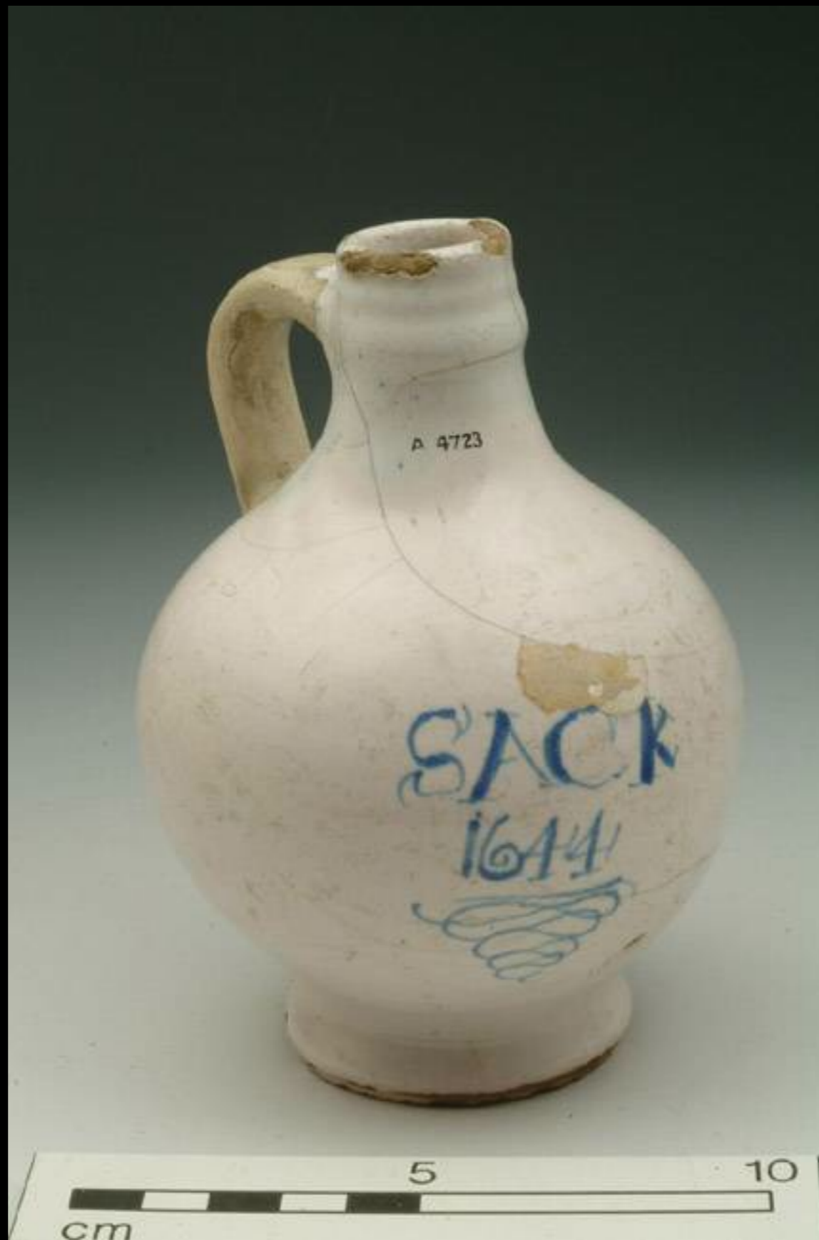
English or Dutch Tin Glazed Earthenware Sack Bottle