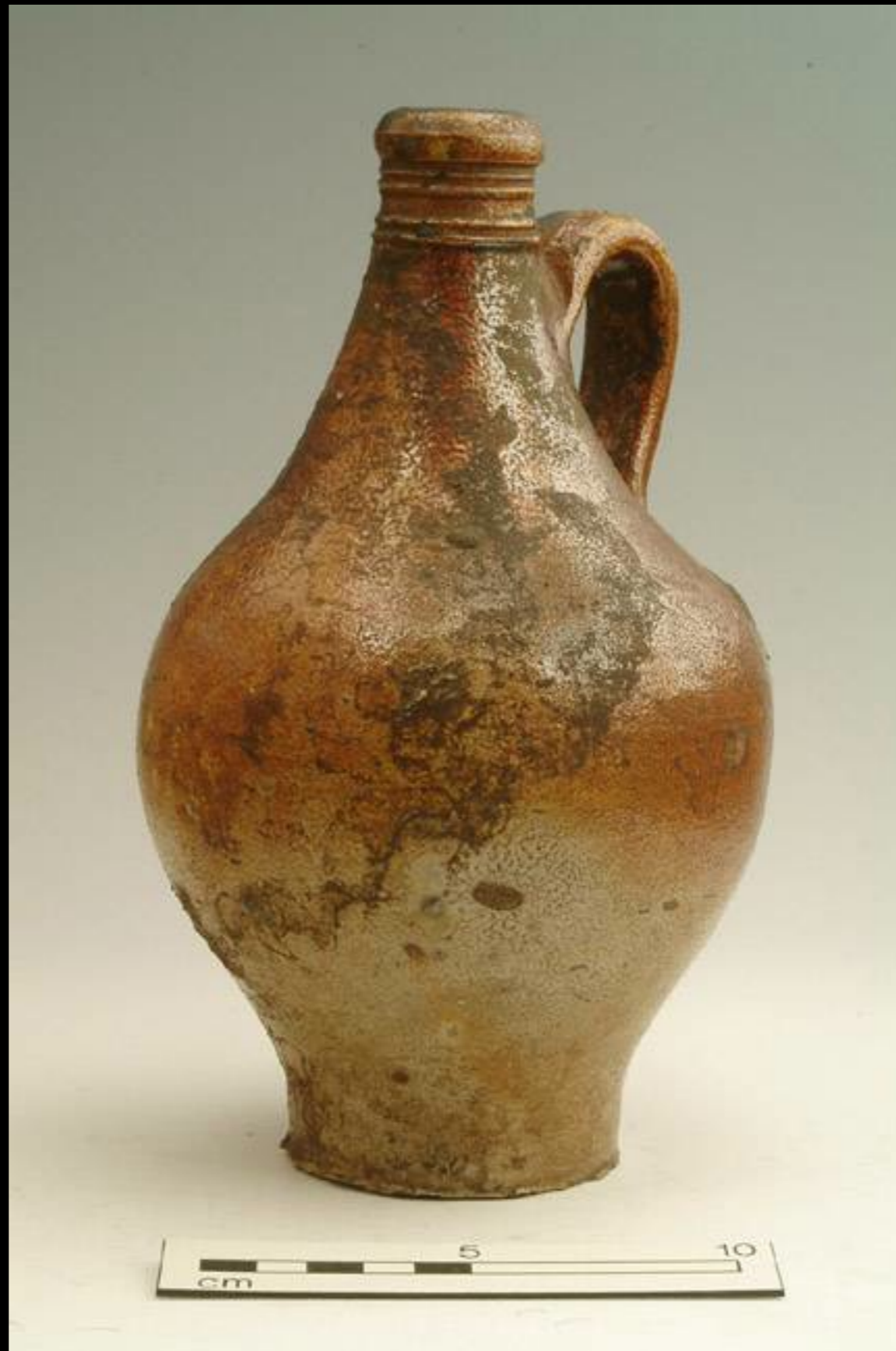
English Salt Glazed Stoneware Bottle from Fulham / Hammersmith, London c. 1671 - 1703 (Museum of London)