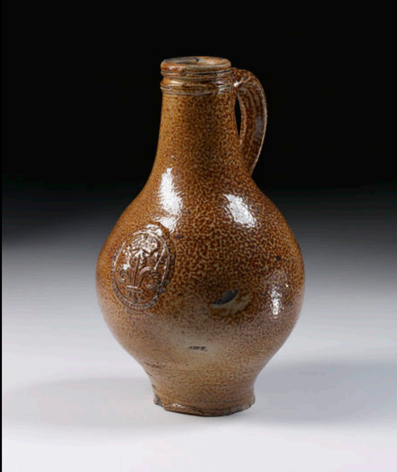
English Salt Glazed Stoneware Jug from Fulham by John Dwight's Fulham Pottery c. 1675 (Victoria & Albert)