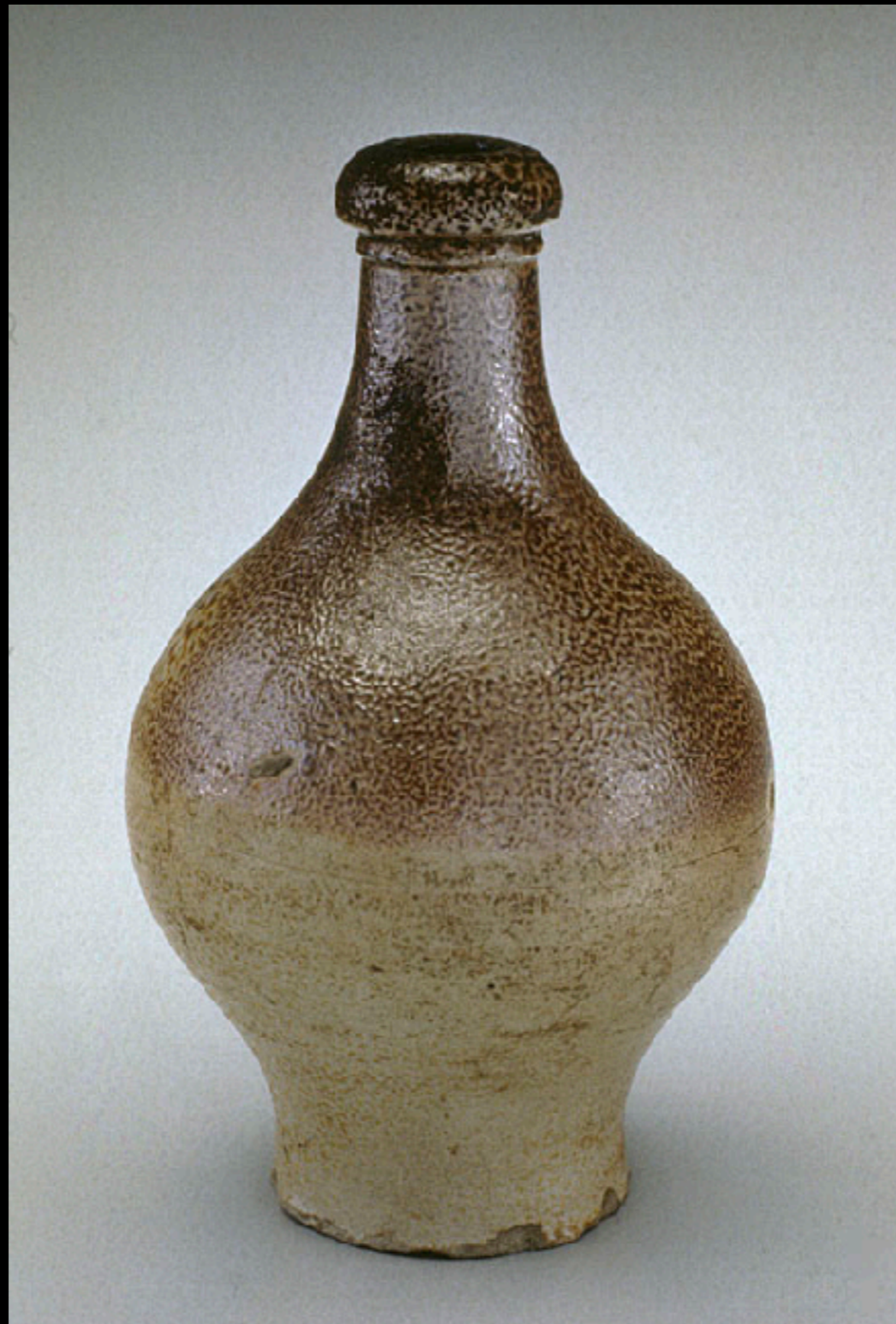
English Salt Glazed Stoneware Bottle from London c. 1740 (Chipstone Foundation)