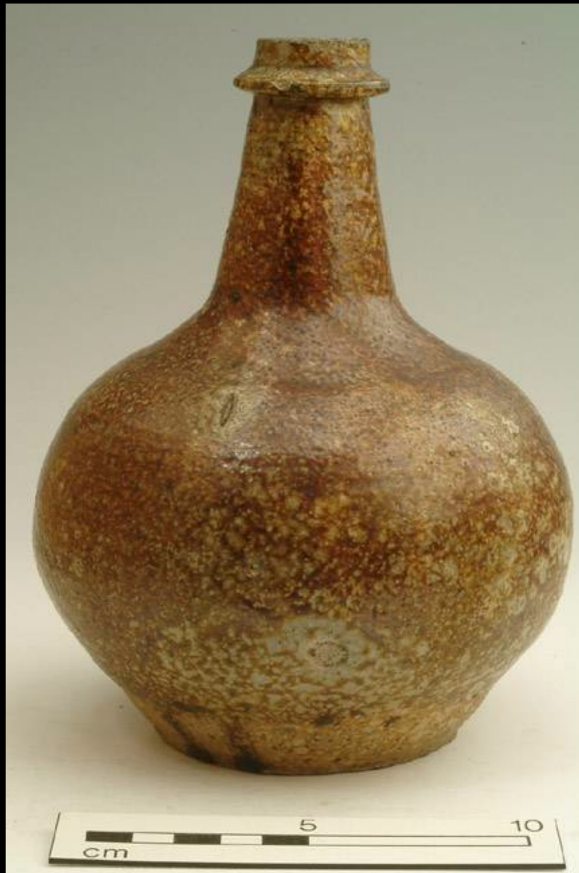
English Salt Glazed Stoneware Bottle from Neck Similar to a Glass Bottle from Fulham / Hammersmith, London c. 1671 - 1703 (Museum of London)