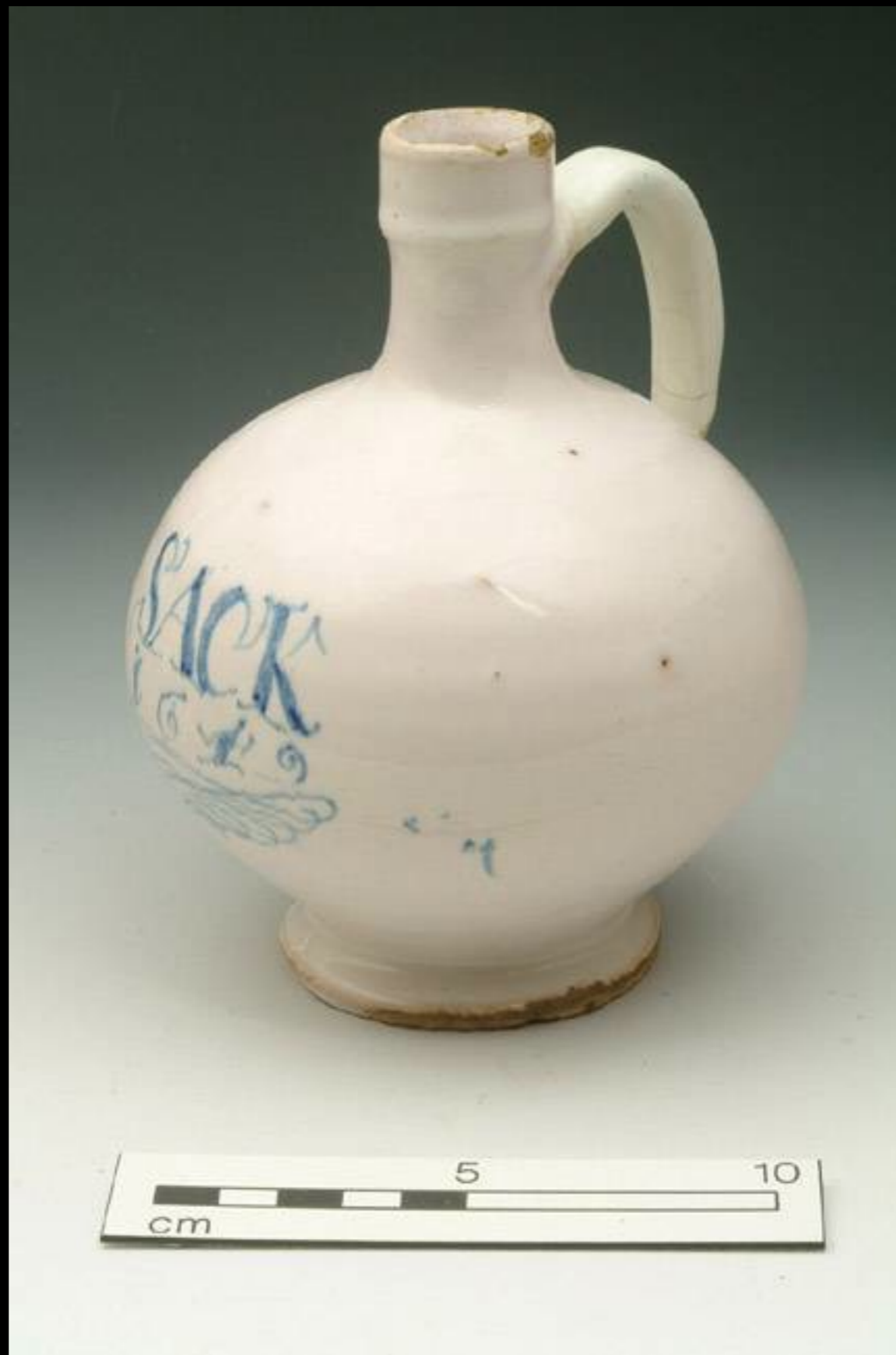
English or Dutch Tin Glazed Earthenware Sack Bottle 1649 (Museum of London)