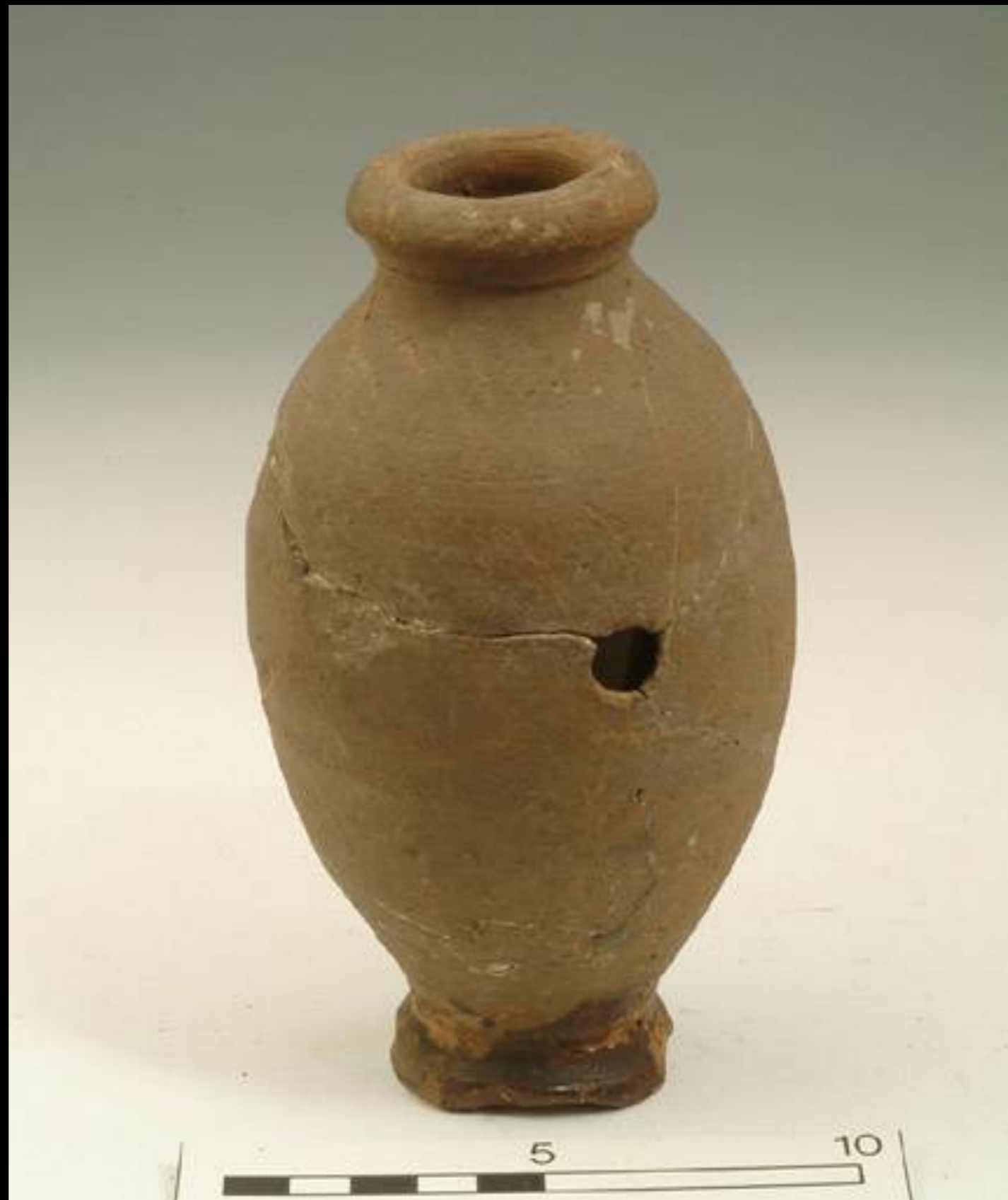
English Earthenware Bottle from London c. 1580 - 1700 (Museum of London)