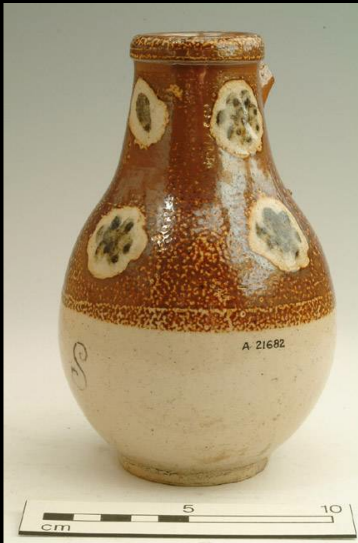
English Salt Glazed Stoneware Bottle from Fulham / Hammersmith, London c. 1671 - 1703 (Museum of London)