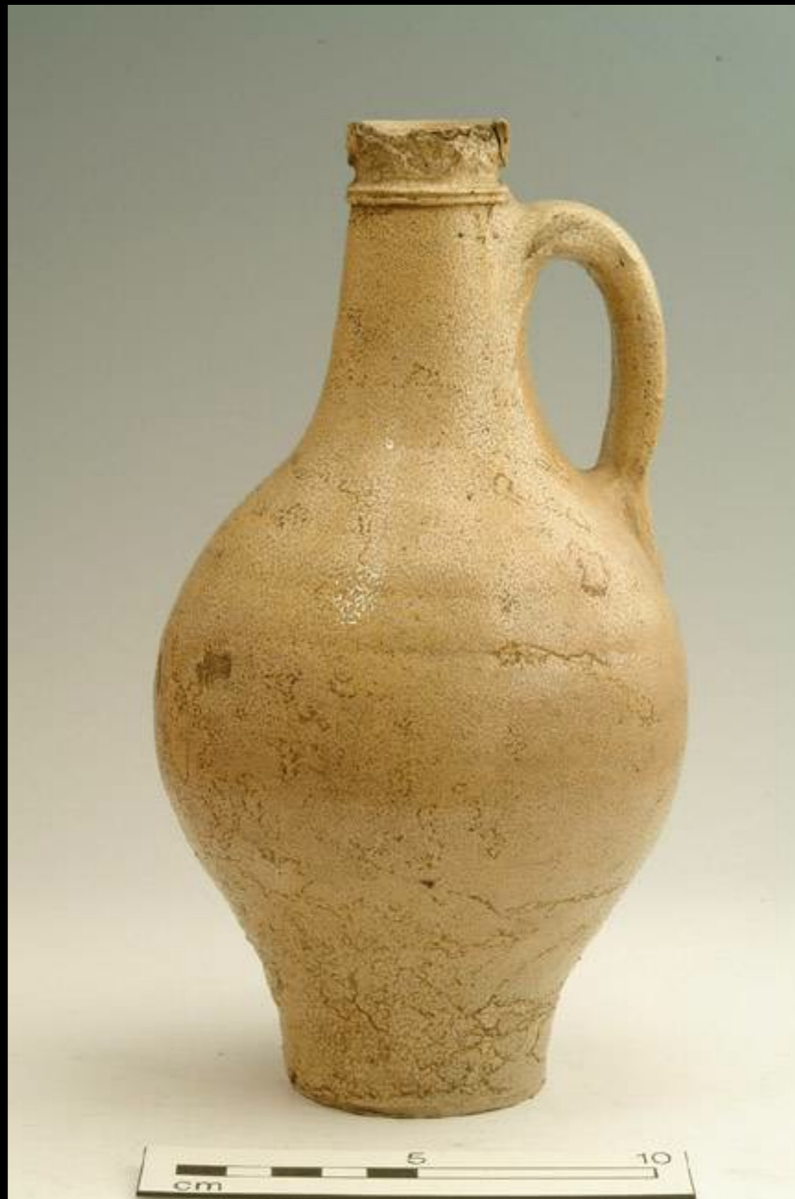
English Salt Glazed Stoneware Bottle from London c. 1671 - 1800 (Museum of London)