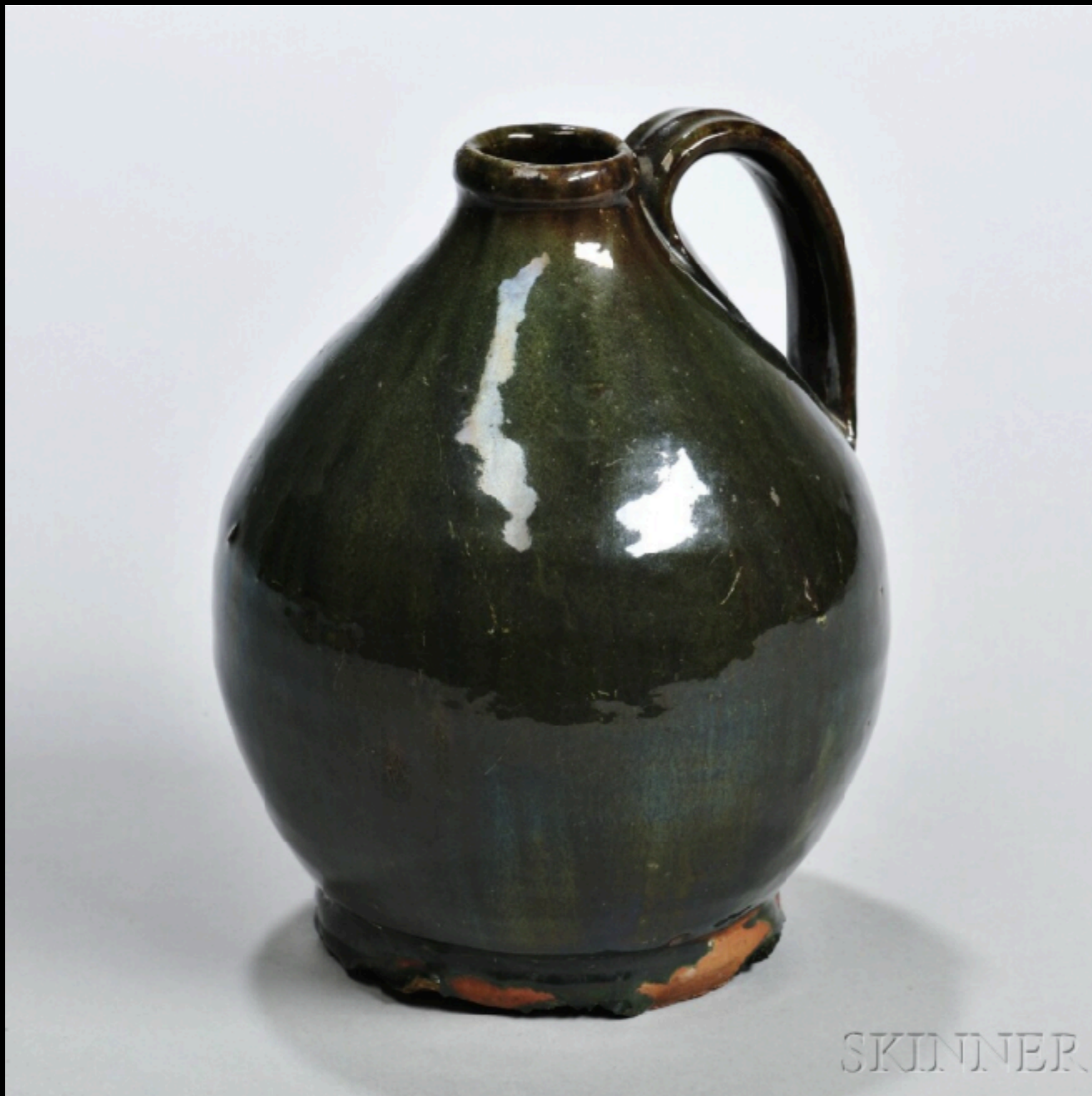
American Lead Glazed Earthenware Jug from Bristol County, Massachusetts Late 18th - Early 19th Century (Skinner)