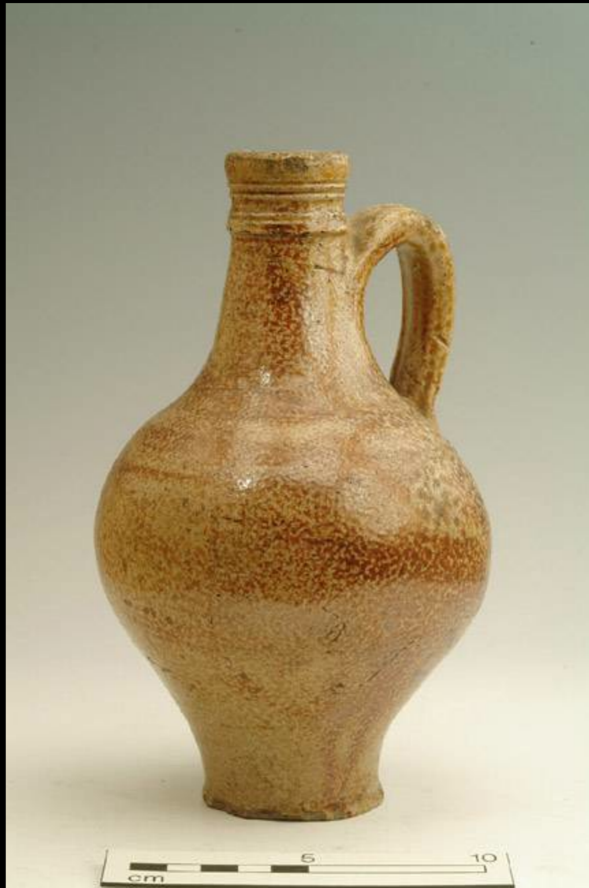
English Salt Glazed Stoneware Bottle from Fulham / Hammersmith, London c. 1671 - 1703 (Museum of London)