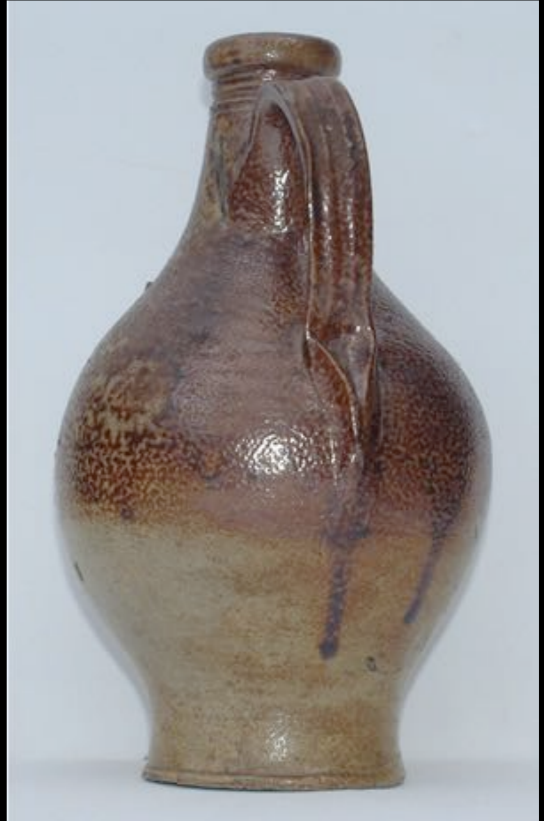
English Salt Glazed Stoneware Bottle from London (Lambeth or Southwark)