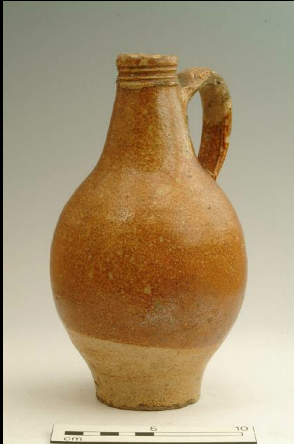
English Salt Glazed Stoneware Bottle from London c. 1671 - 1800 (Museum of London)