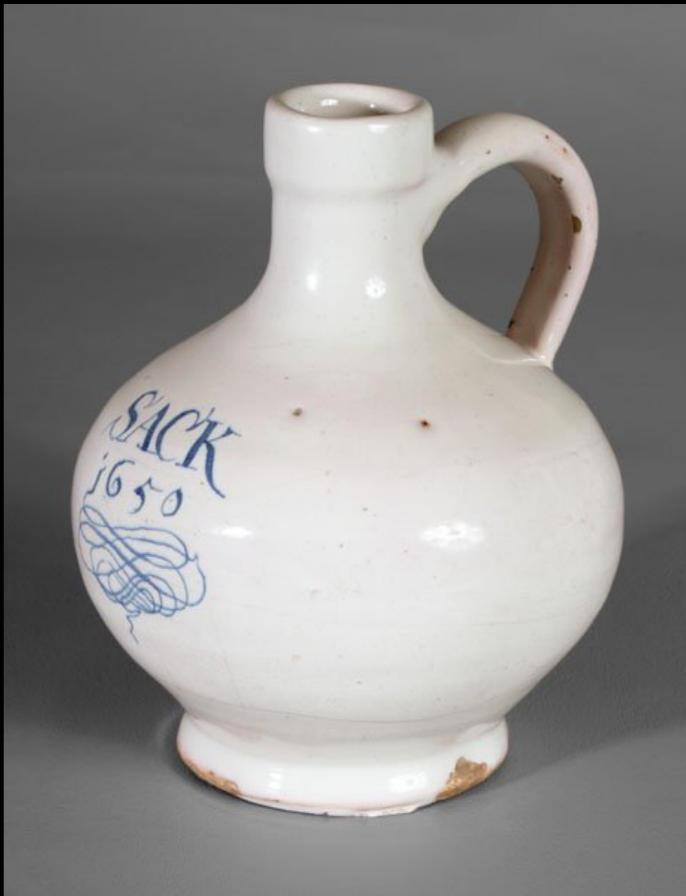
English or Dutch Tin Glazed Earthenware Sack Bottle