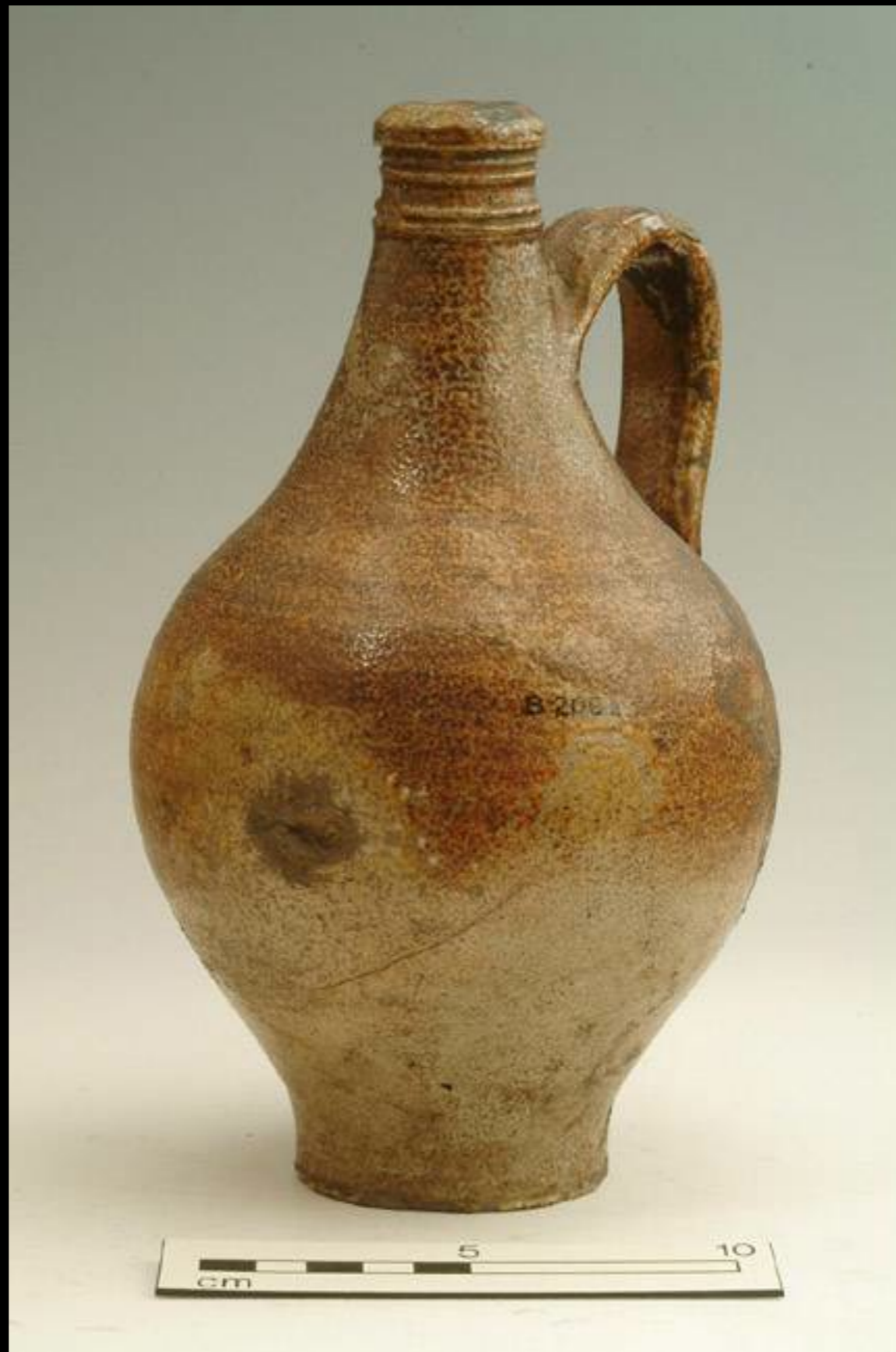
English Salt Glazed Stoneware Bottle from Fulham / Hammersmith, London c. 1671 - 1703 (Museum of London)