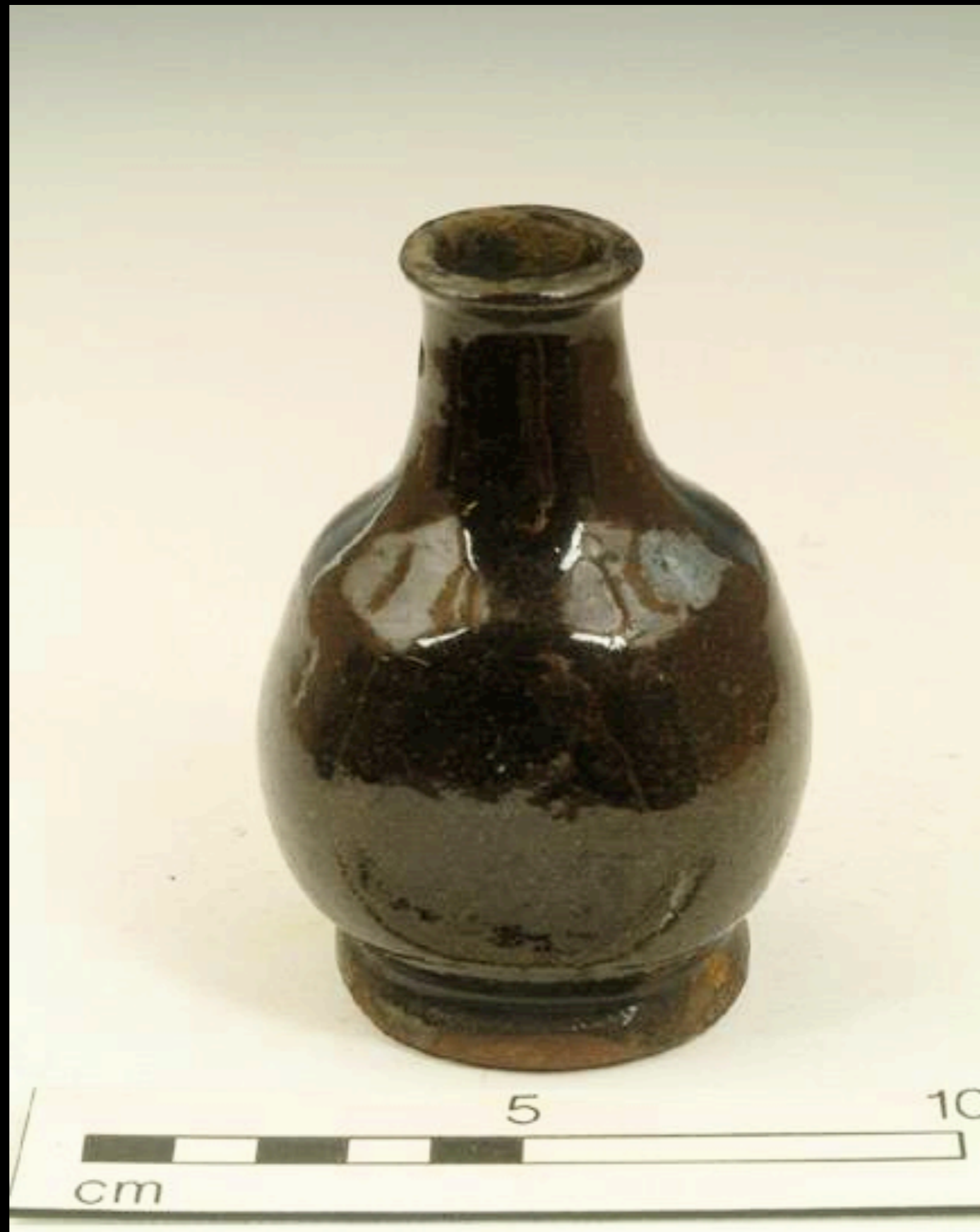
English Lead Glazed Earthenware Bottle from the Midlands c. 1600 - 1800 (Museum of London)