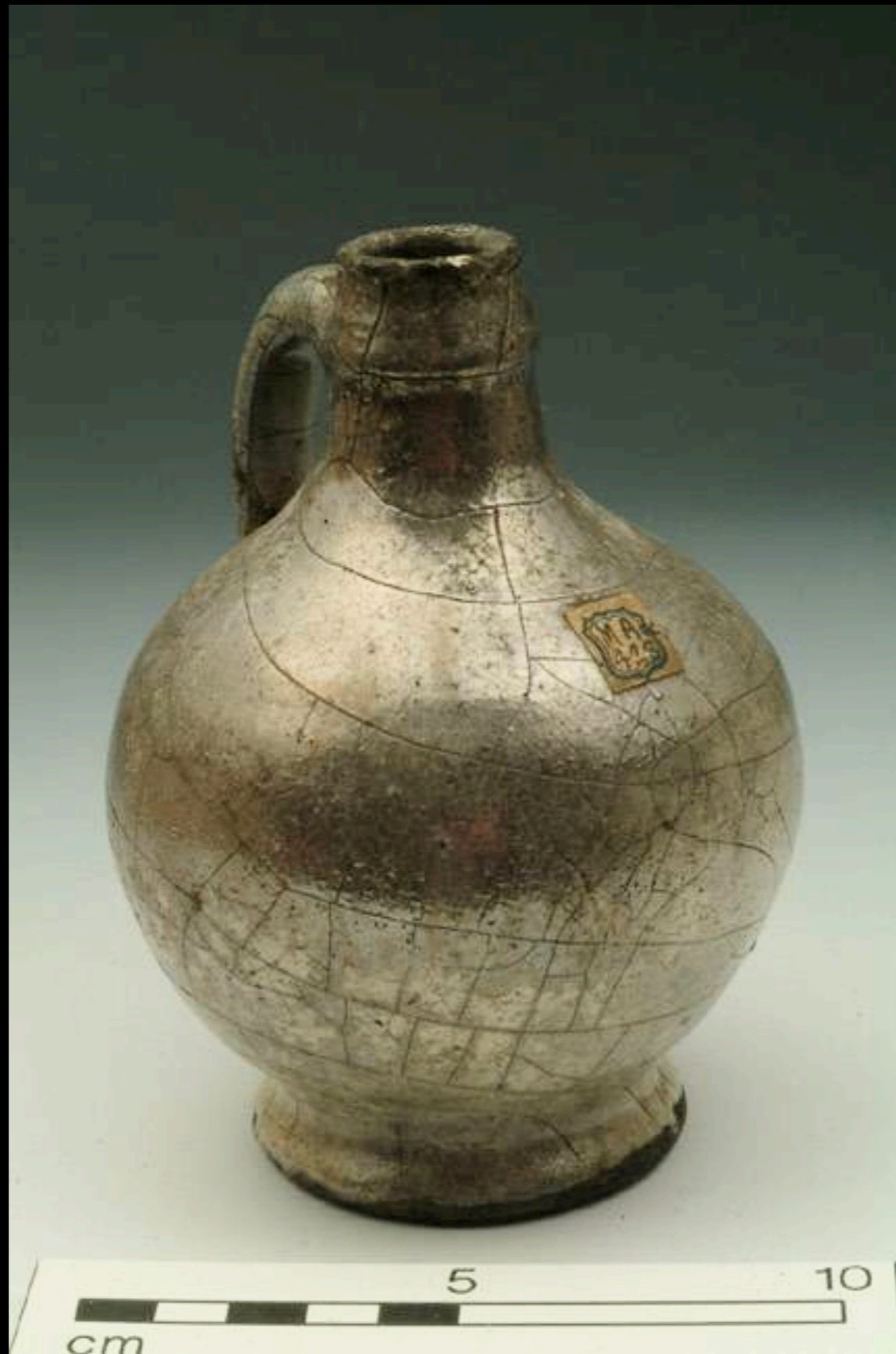
English or Dutch Tin Glazed Earthenware Bottle (Blackened & Sooted by Fire) c. 1601 - 1700 (Museum of London)