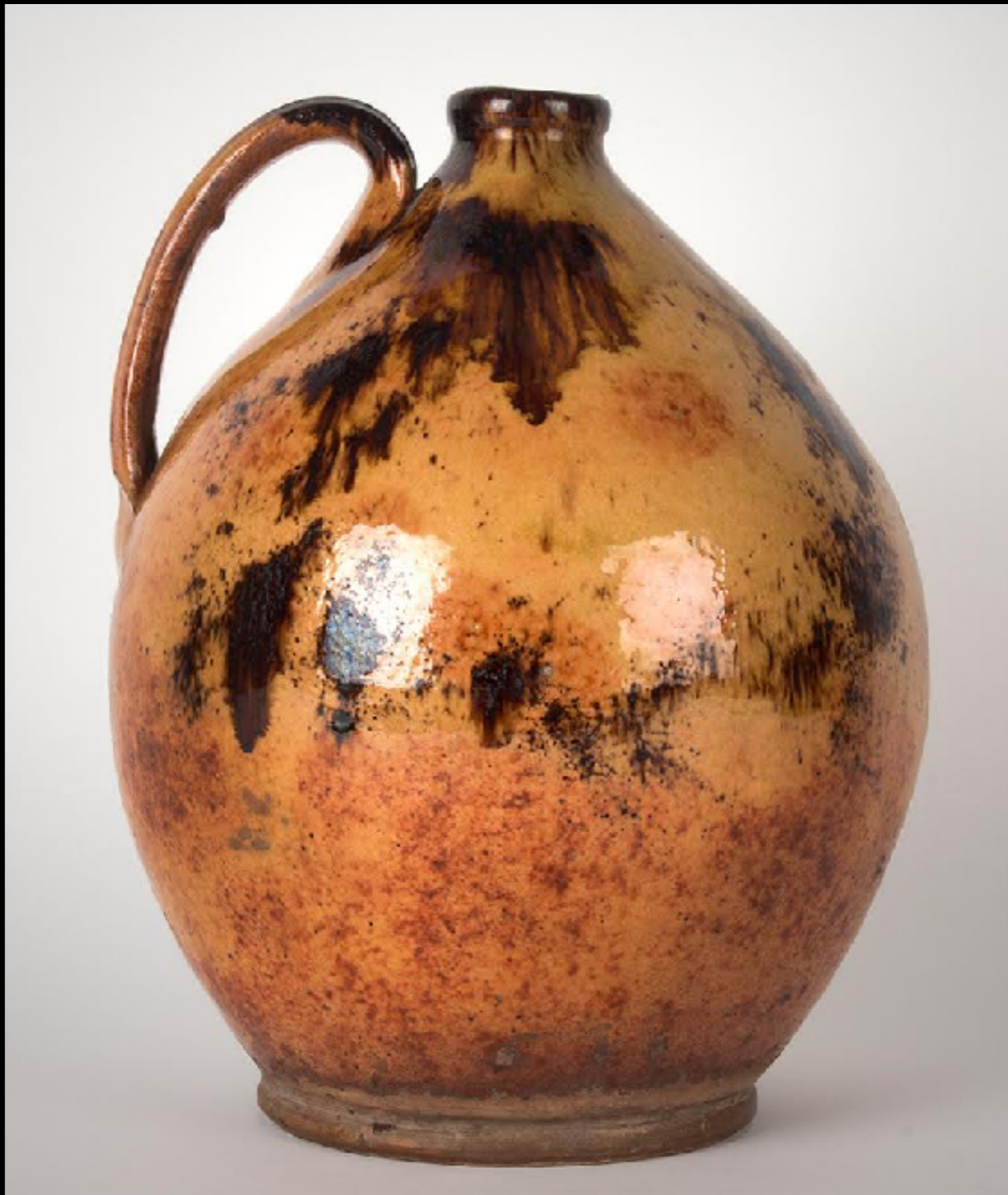
American Lead Glazed Earthenware Jug from Southeastern Massachusetts c. 1780 - 1820