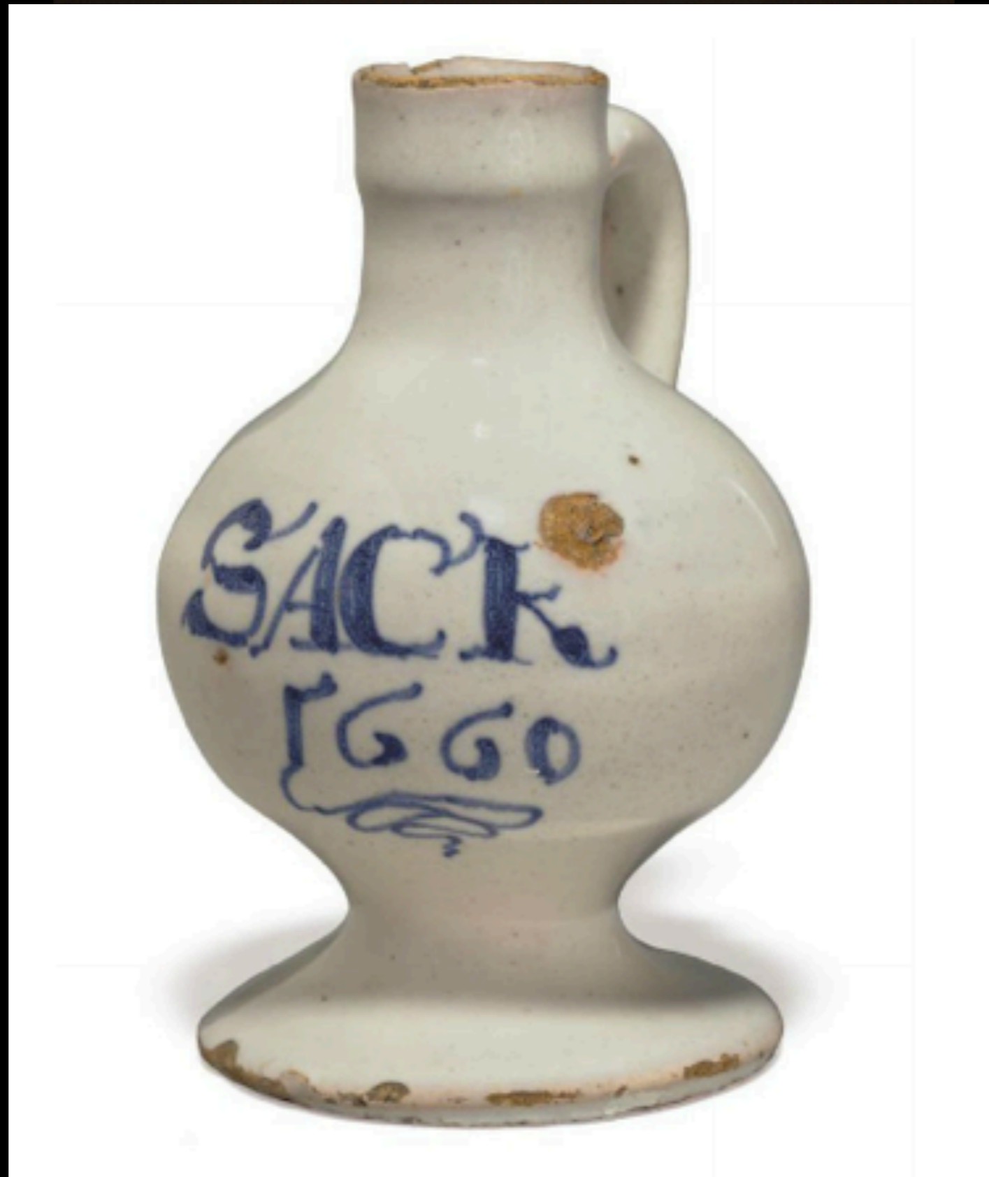
English or Dutch Tin Glazed Earthenware Sack Bottle