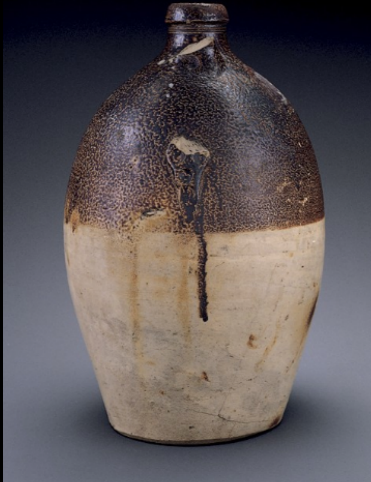
English Salt Glazed Stoneware Bottle from London, Probably Fulham