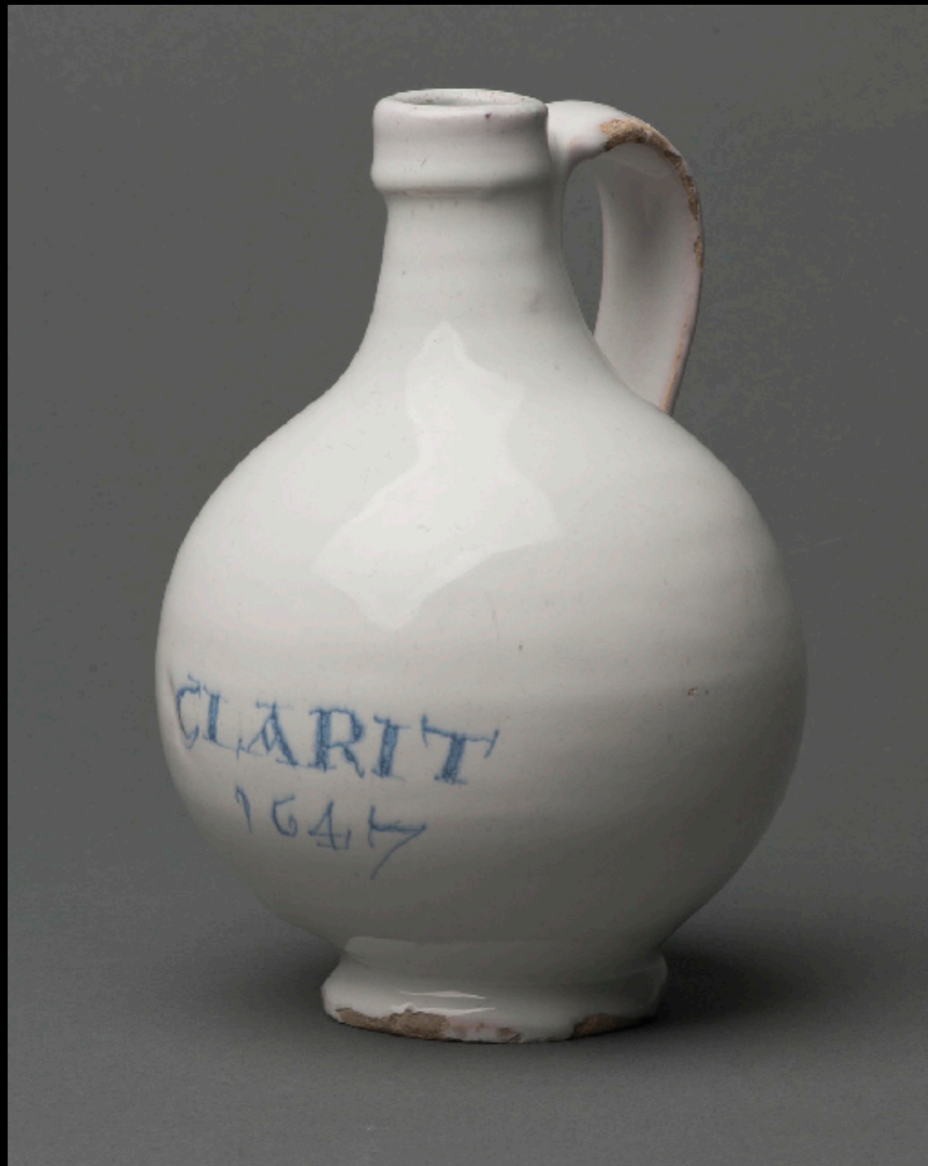
English or Dutch Tin Glazed Earthenware Clarit Bottle