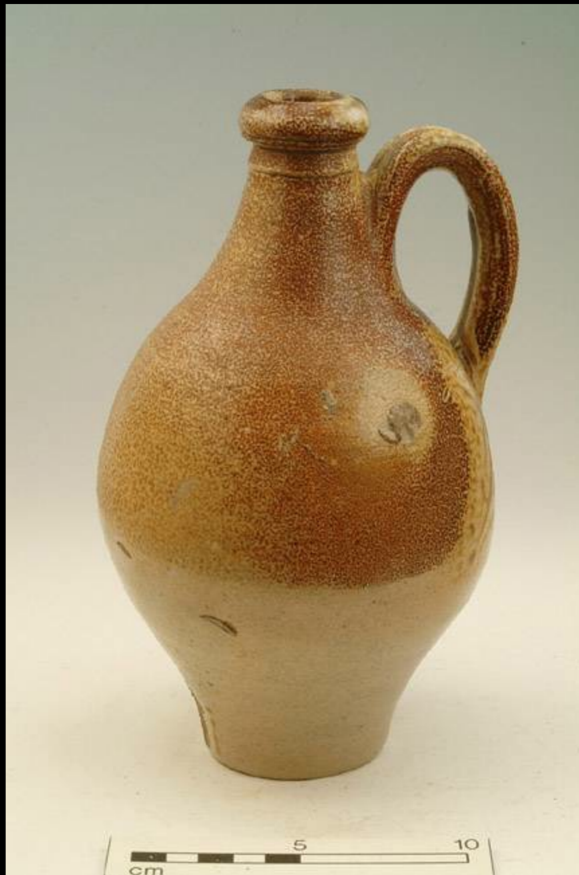
English Salt Glazed Stoneware Bottle from London c. 1671 - 1800 (Museum of London)