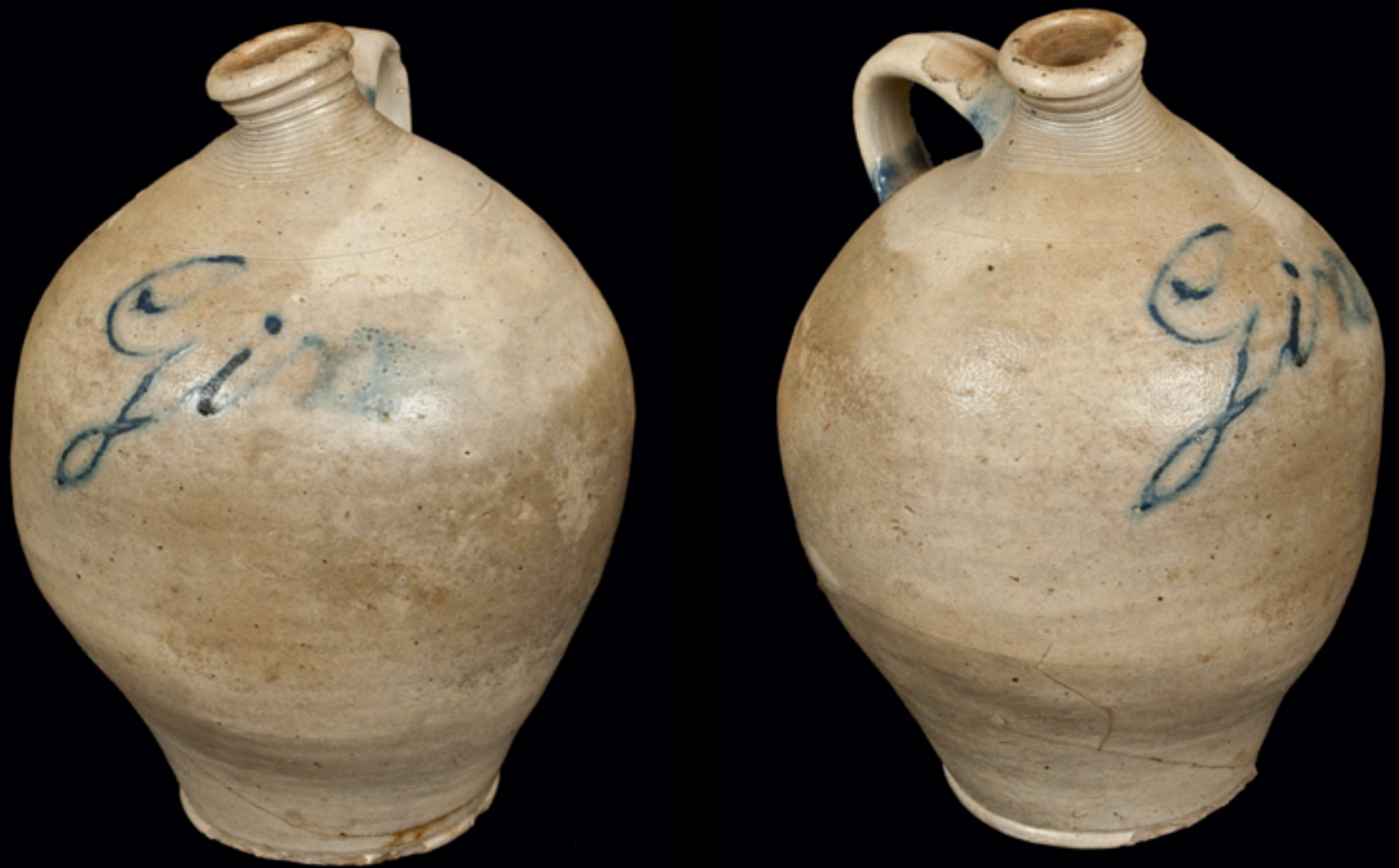
American 1 & 1/2 Gallon Stoneware Jug with Slip - Trailed "Gin" Decoration from New Jersey Marked "Gin" Late 18th - Early 19th Century