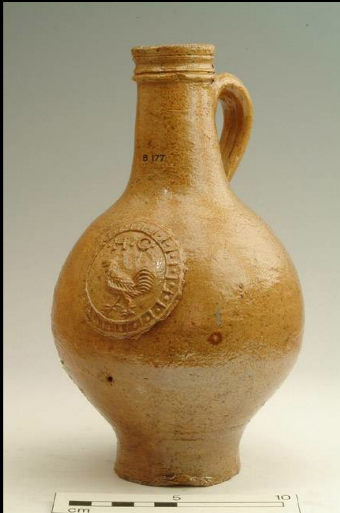
English Salt Glazed Stoneware Bottle with Medallion for the Cock Tavern on Fleet Street from Fulham / Hammersmith, London c. 1671 - 1800 (Museum of London)