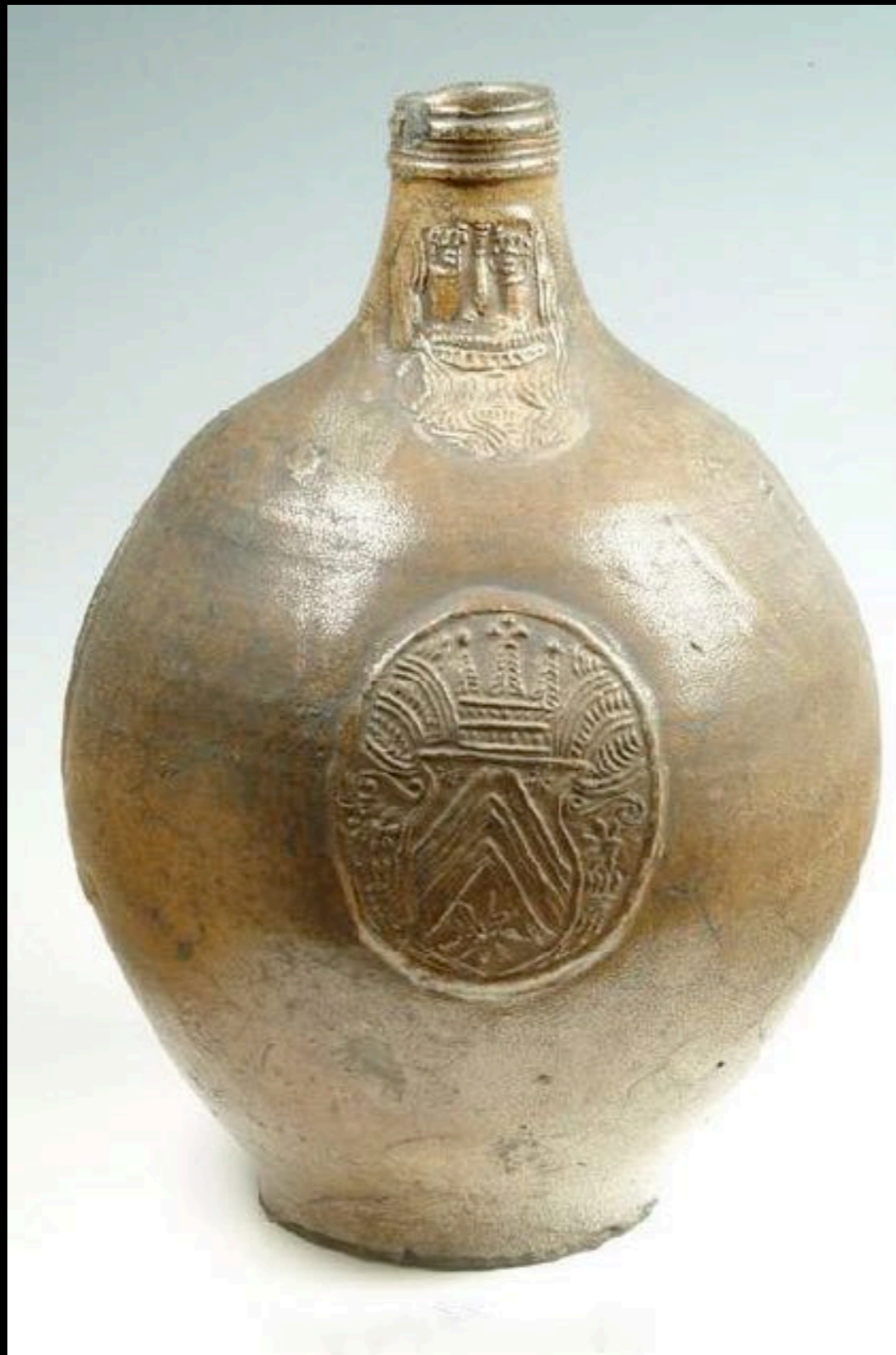
English Salt Glazed Stoneware Bellarmine Jug from London 17th Century (Museum of London)