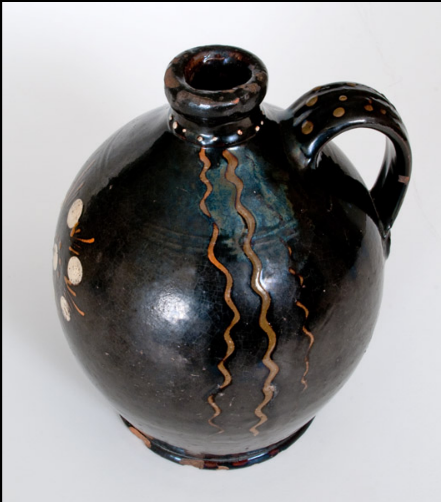
American Lead Glazed Earthenware Jug from Alamance County, North Carolina Late 18th - Early 19th Century (Crocker Farm)