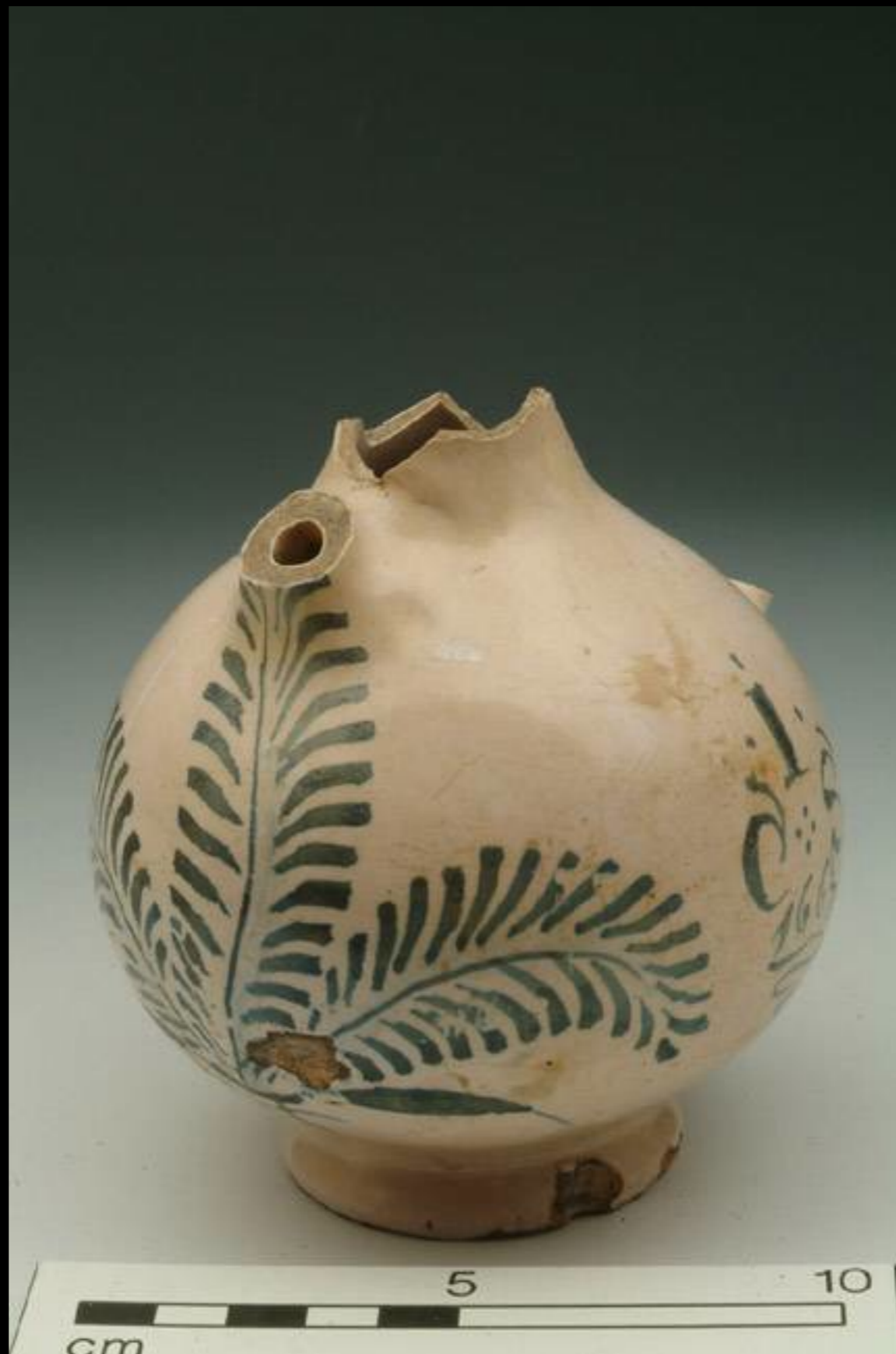
English Tin Glazed Earthenware Wine Bottle from Southwark, London Inscribed "CIS 1667" (Victoria & Albert)