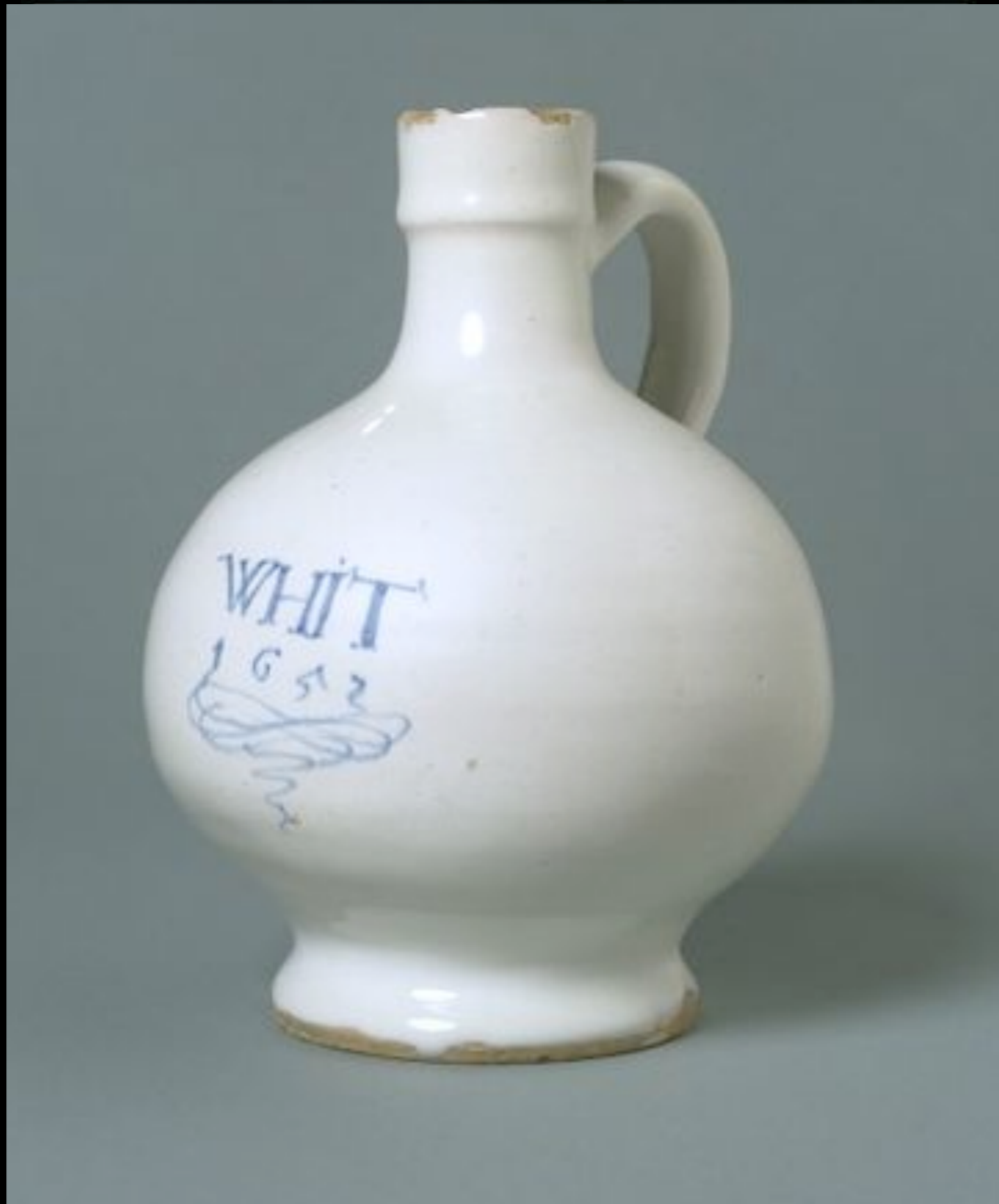
English Tin Glazed Earthenware Whit Bottle from London