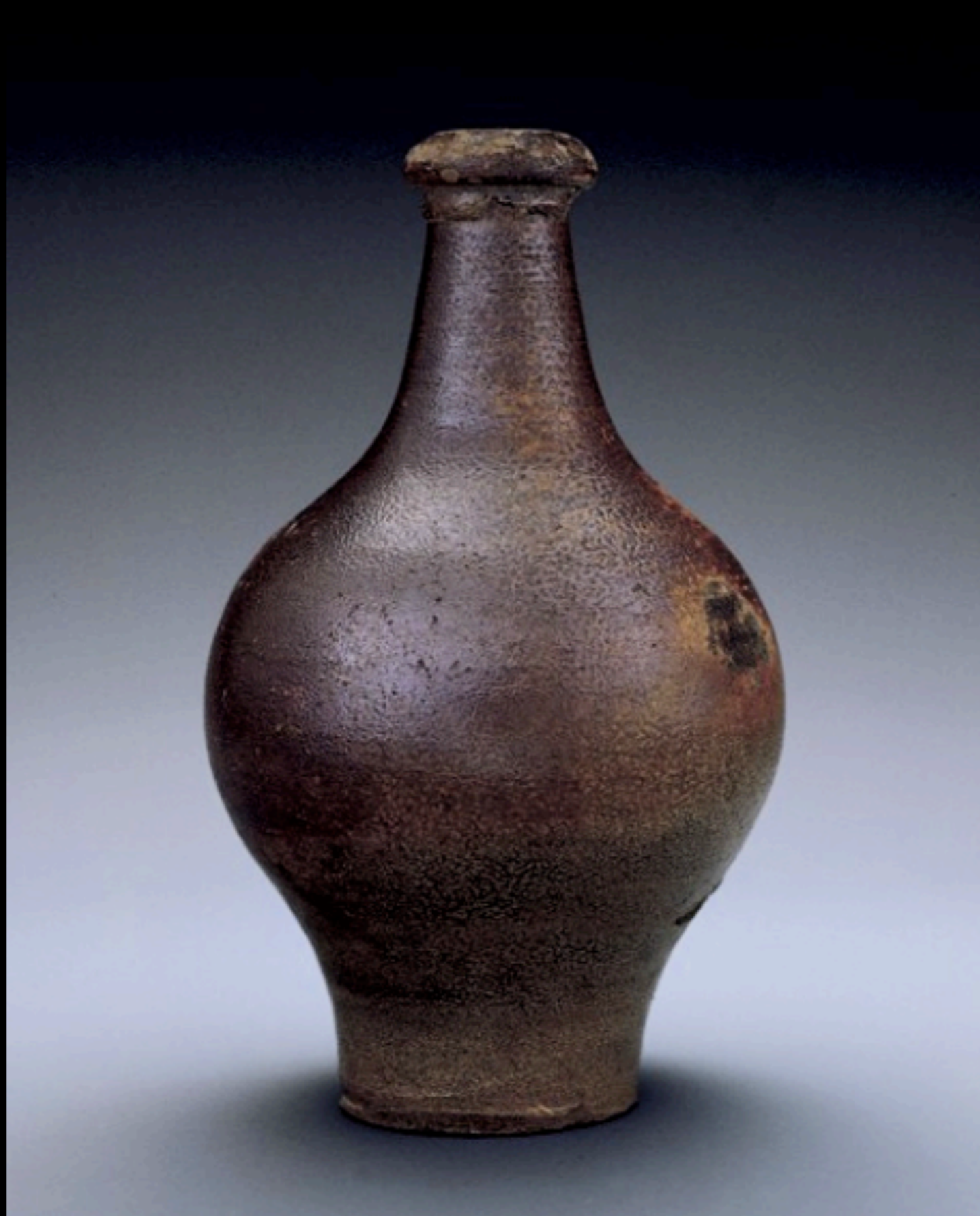
English Salt Glazed Stoneware Bottle from London