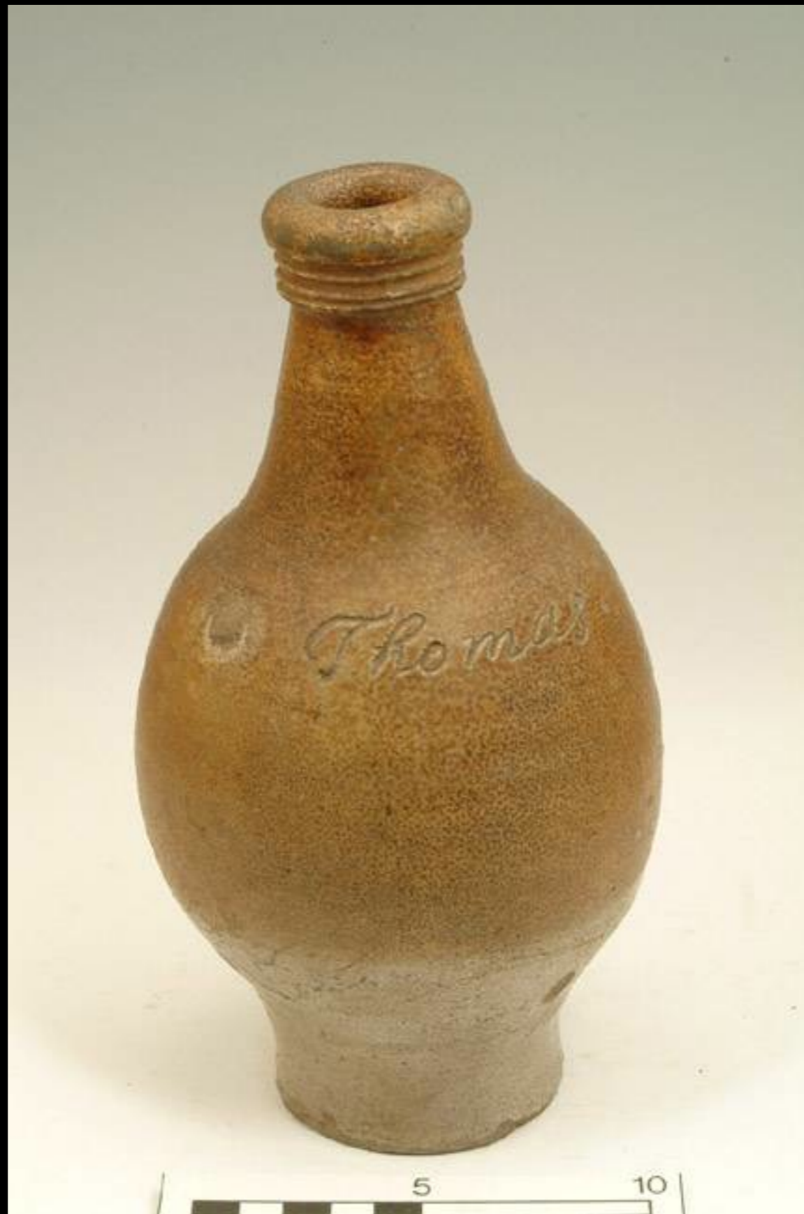
English Salt Glazed Stoneware Bottle Inscribed "Thomas" from Fulham / Hammersmith, London c. 1701 - 1800 (Museum of London)