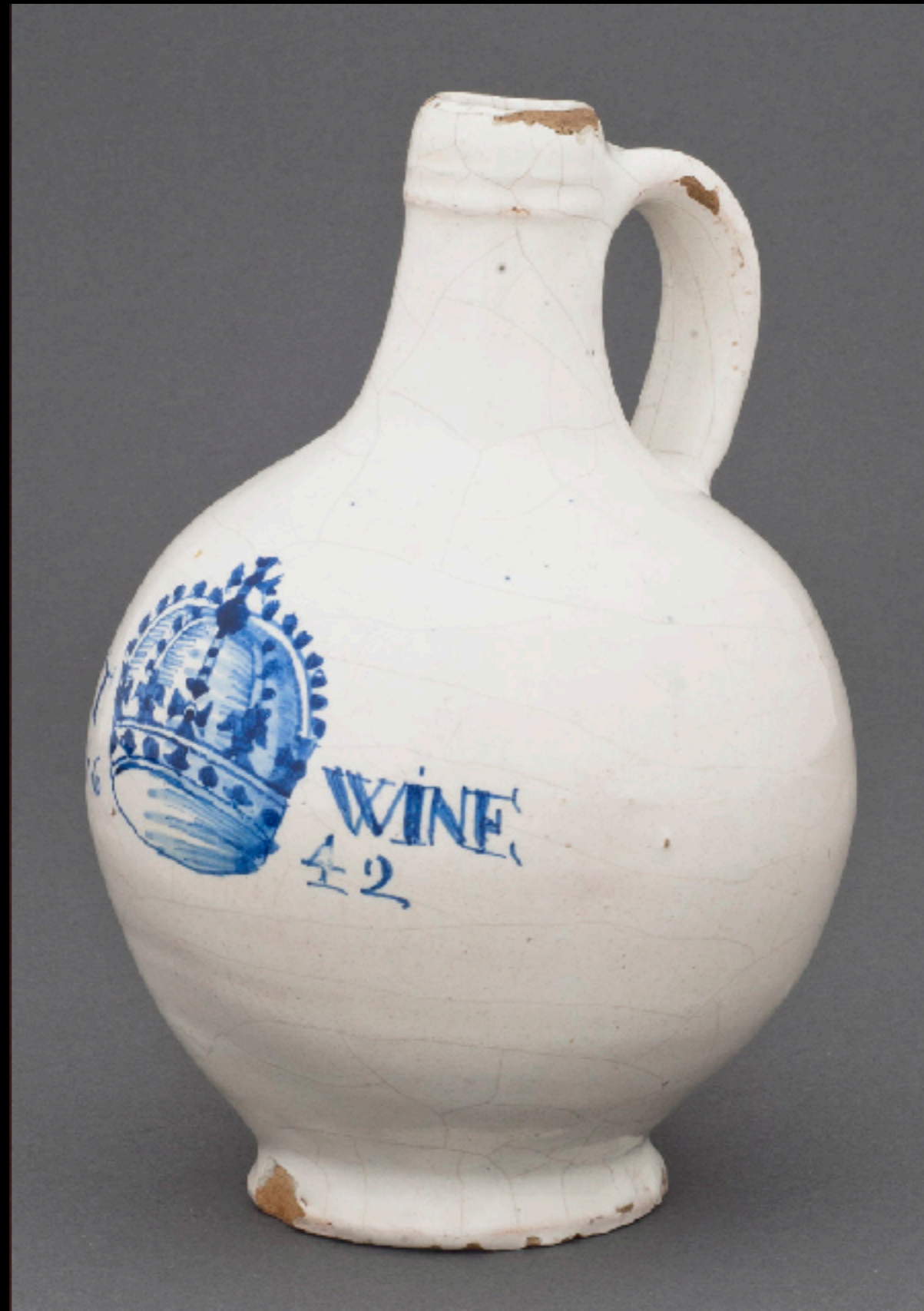
English Tin Glazed Earthenware Whit Bottle Commemorating King Charles I from Southwark, London