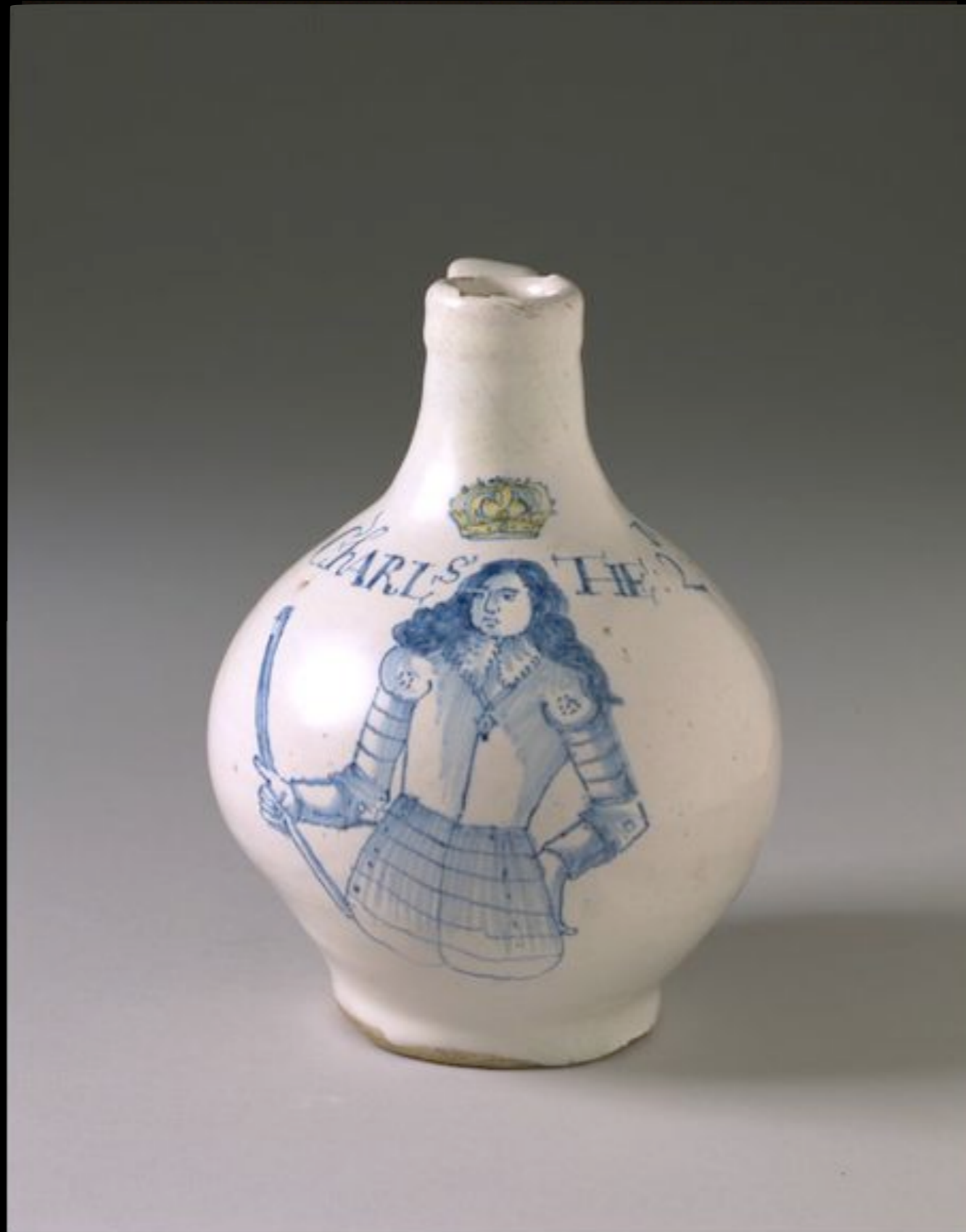
English Tin Glazed Earthenware Sack Bottle Commemorating King Charles the Second from London