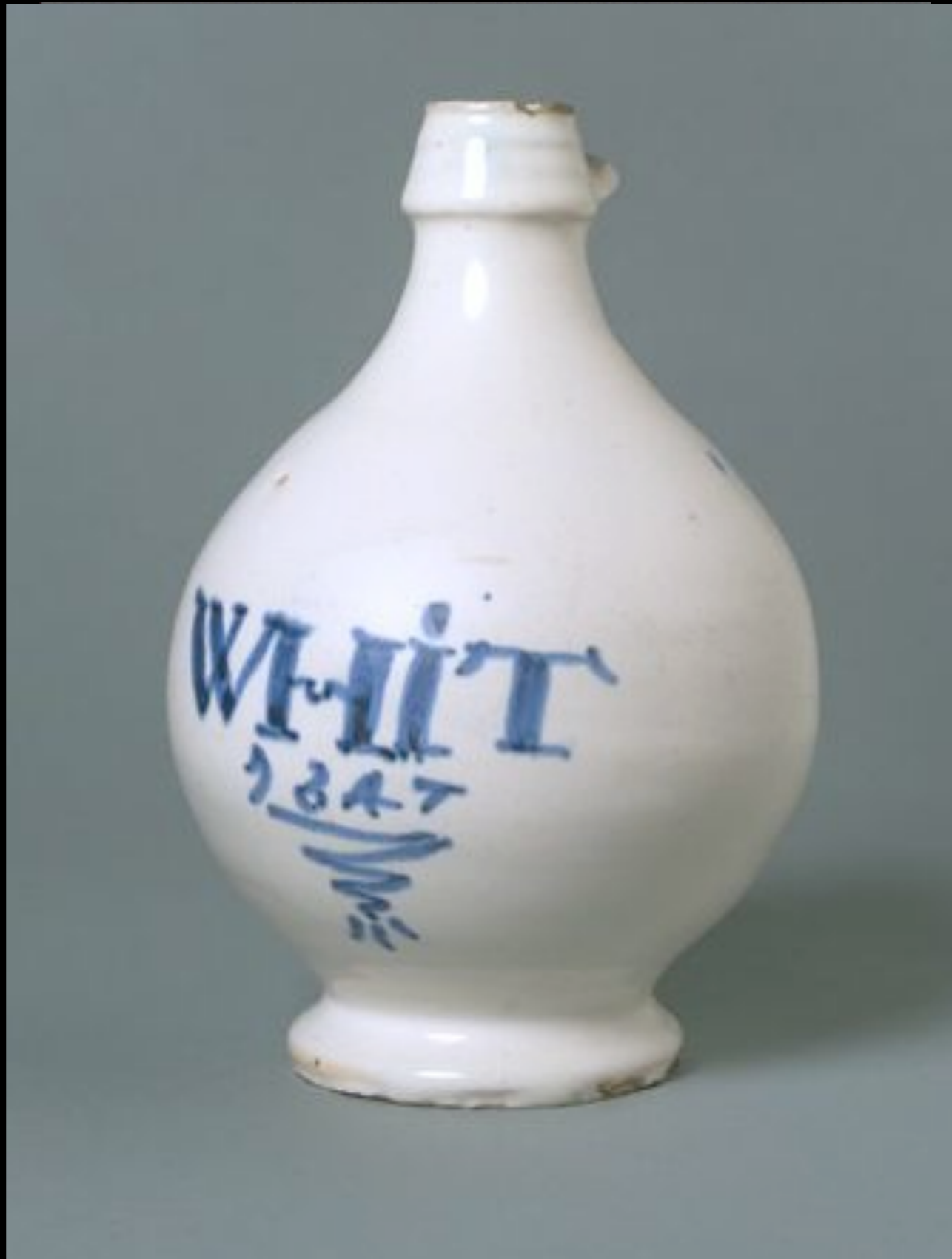
English or Dutch Tin Glazed Earthenware Whit Bottle from London