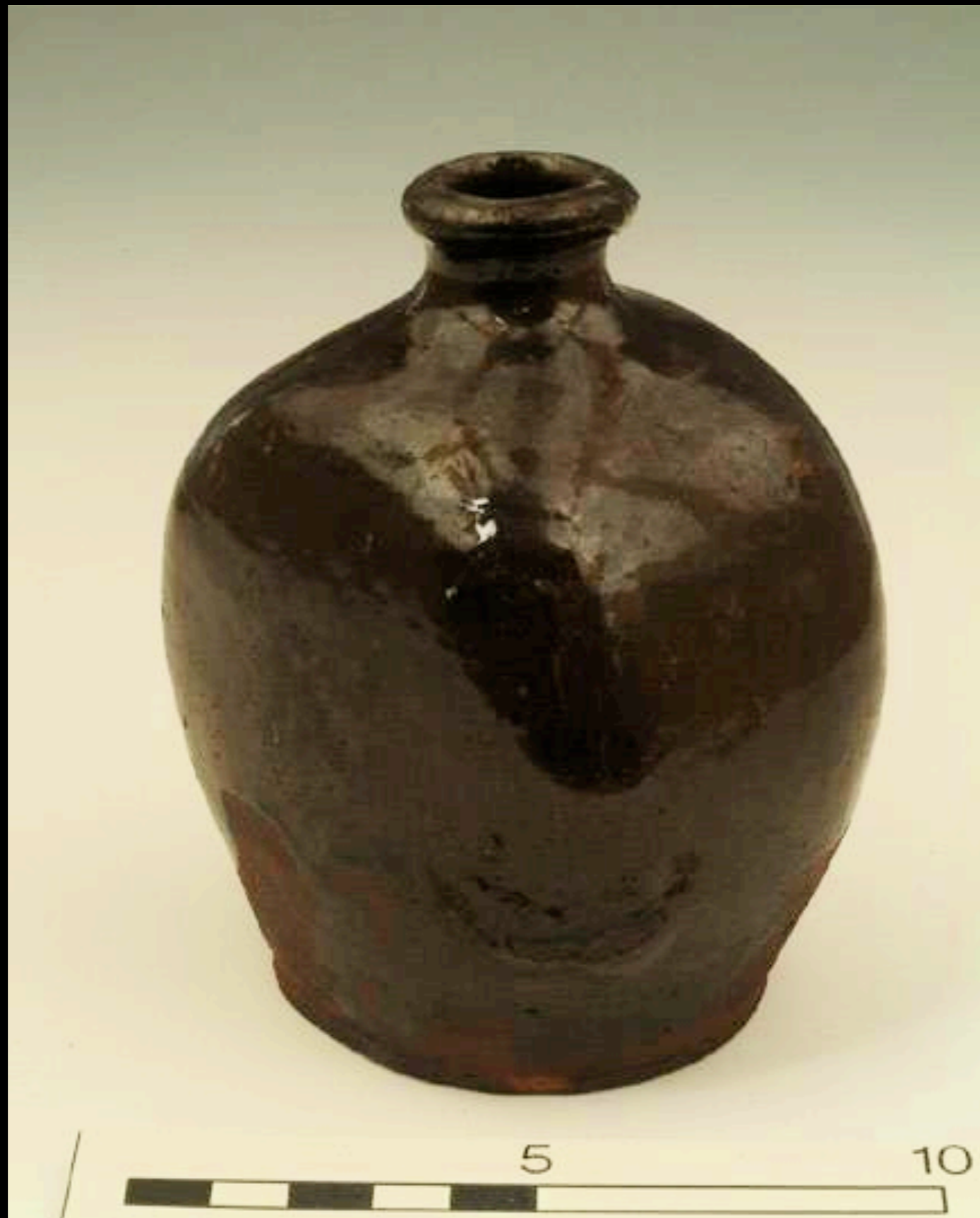
English Lead Glazed Earthenware Bottle c. 1485 - 1714 (Museum of London)