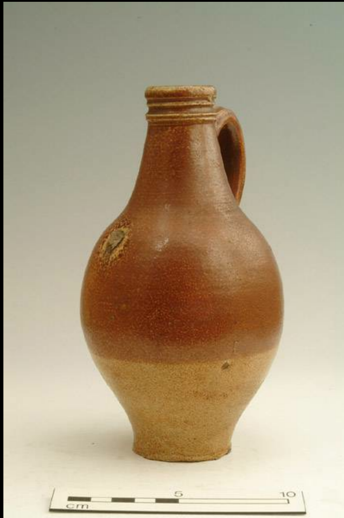
English Salt Glazed Stoneware Bottle from London c. 1671 - 1800 (Museum of London)