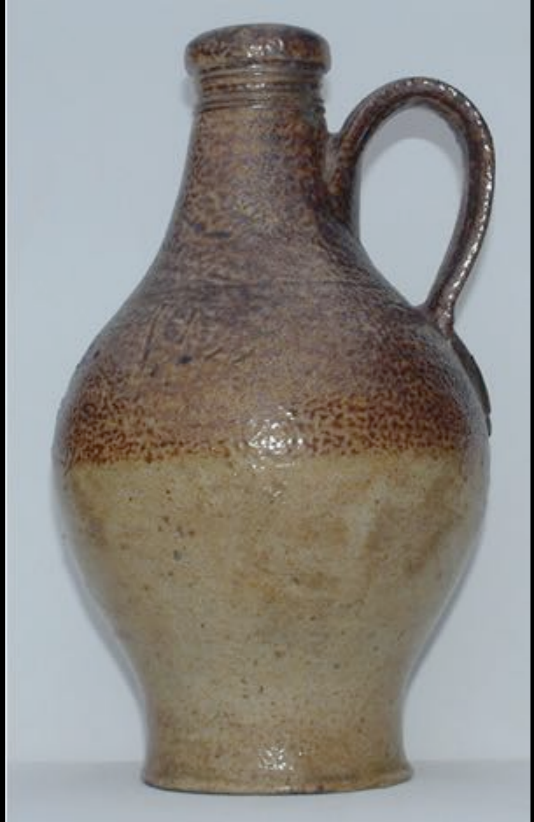
English Salt Glazed Stoneware Bottle from London (Lambeth or Southwalk)