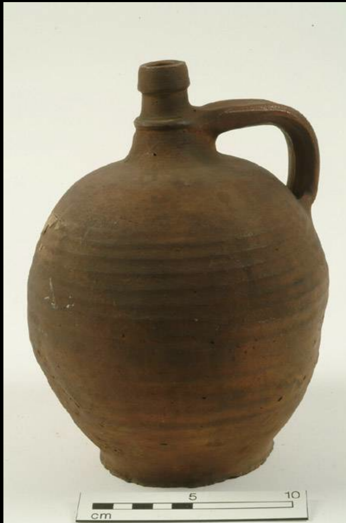
Brown Stoneware Bottle - Found in England - Unknown Origin (Possibly Mediterranean) c. 1701 - 1800 (Museum of London)