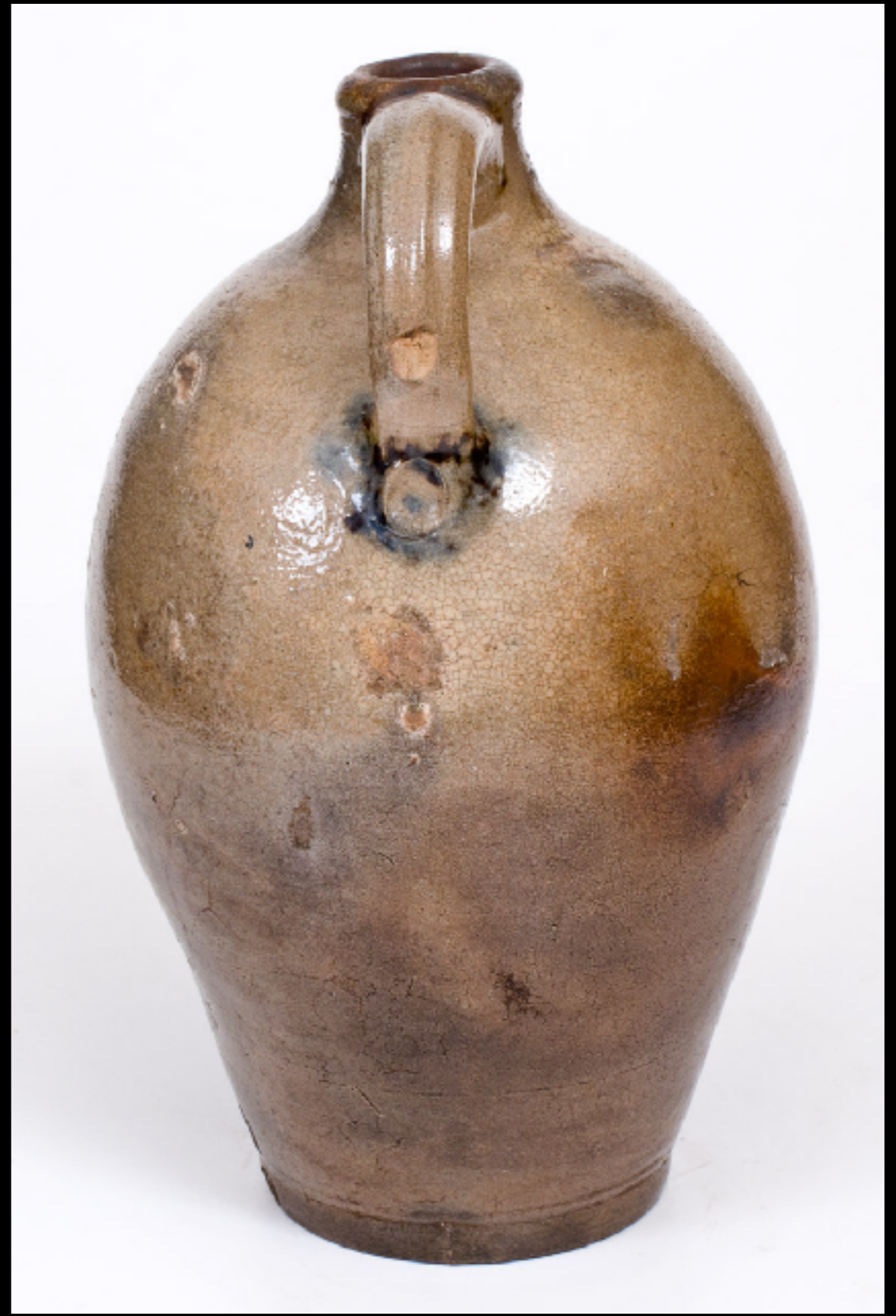
American Stoneware 2 Gallon Jug from Manhattan, New York Late 18th Century (Crocker Farm Auction House)