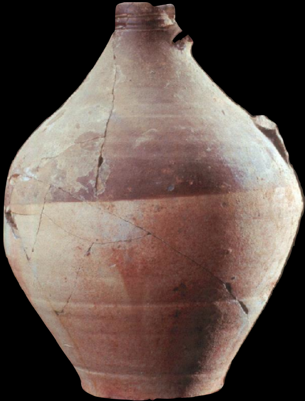
Brown Salt-glazed Stoneware Jug Excavated at Yorktown, Virginia c. 1720 - 1740 (Ceramics in America)