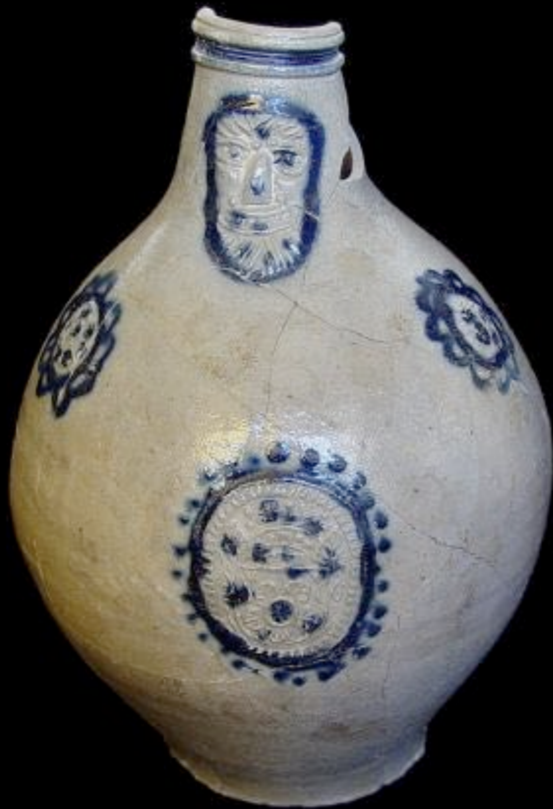
English Salt Glazed Stoneware Bellarmine Jug from London 17th Century (Private Collection)