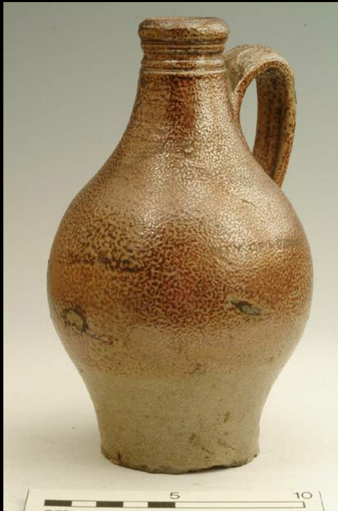
English Salt Glazed Stoneware Bottle from London c. 1671 - 1800 (Museum of London)