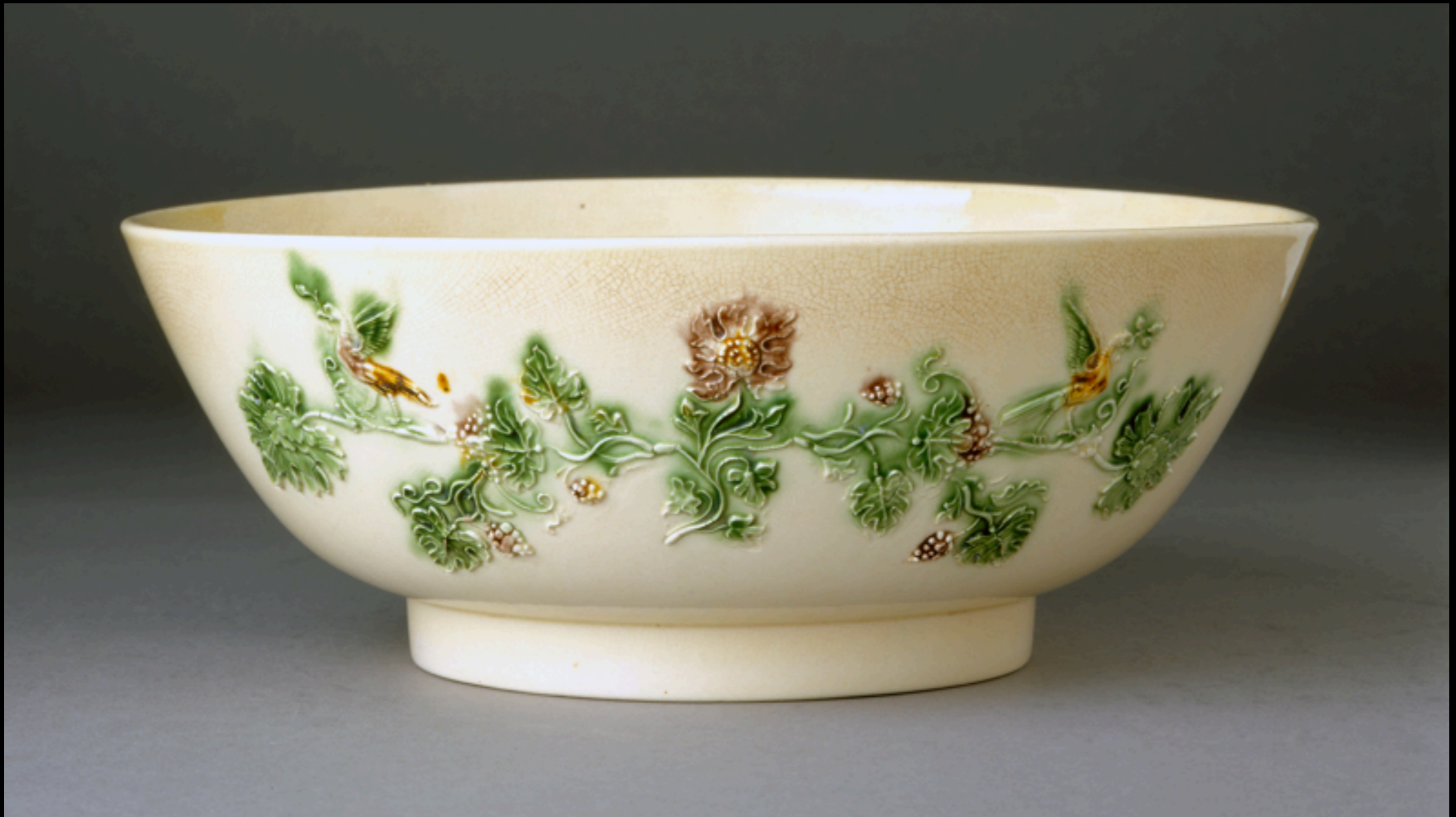
English Lead Glazed Earthenware Punch Bowl from Little Fenton, Staffordshire