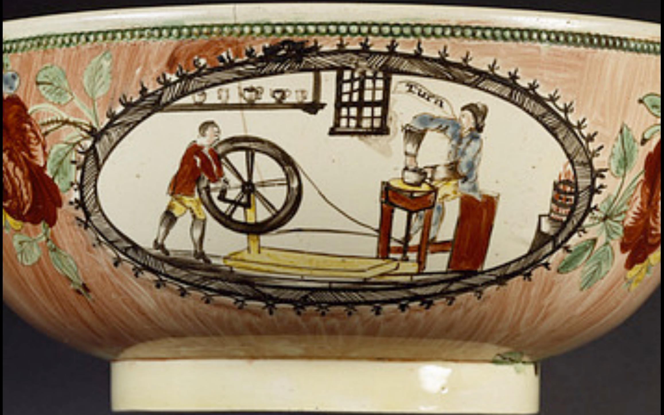
English Lead Glazed Creamware Punch Bowl with Enamel Decoration Depicting a Pottery Factory from Leeds