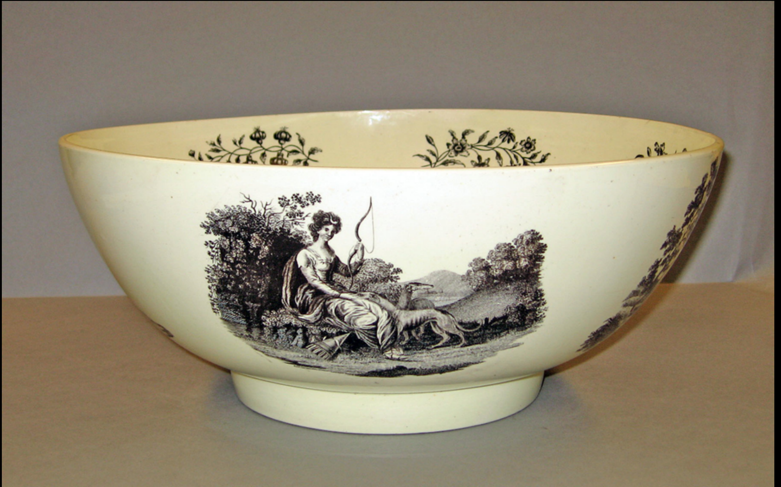
English Lead Glazed Creamware Punch Bowl from Staffordshire Depicting the Etruria Factory or Paris Mining Company by Wedgwood's Etruria Factory c. 1774 - 1784 (Winterthur)