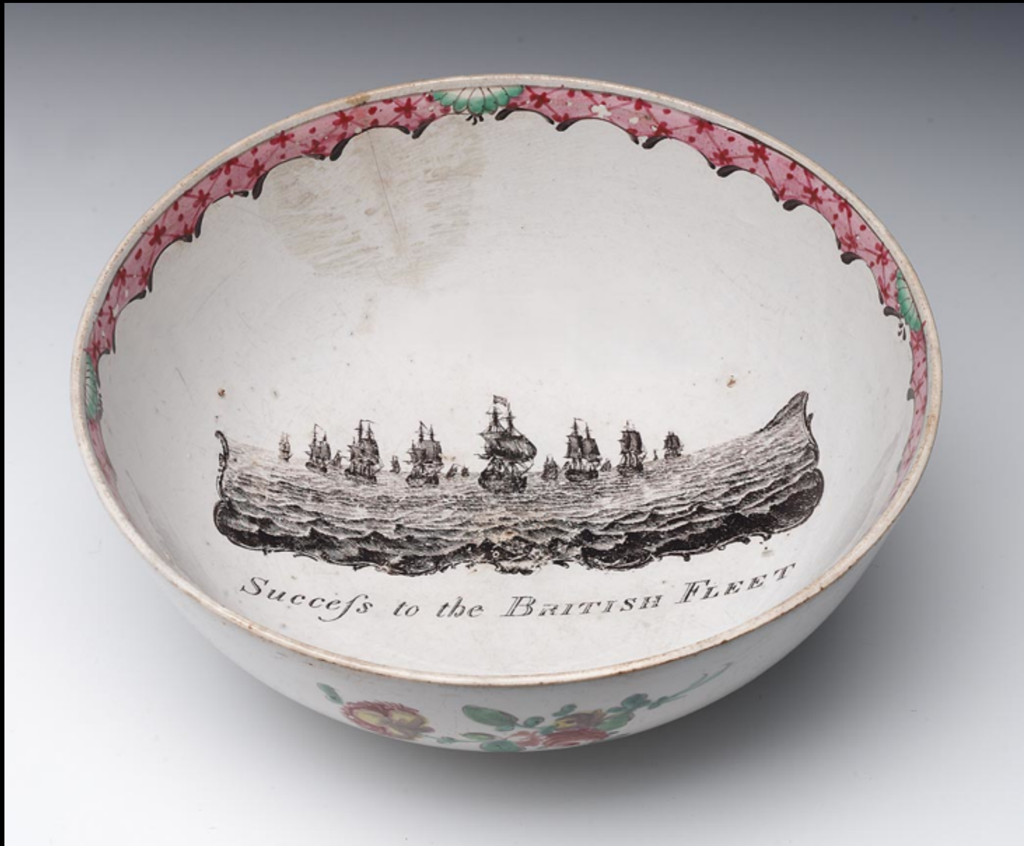
English Earthenware Punch Bowl Marked "Success to the British Fleet"