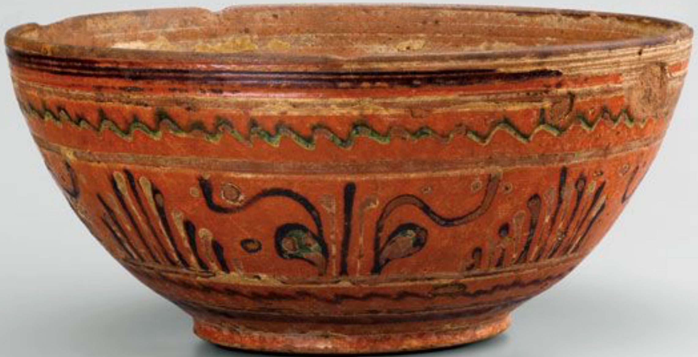
American Lead Glazed Earthenware Punch Bowl from Alamance County, North Carolina c. 1790 - 1810 (Private Collection / Old Salem Museums & Gardens)