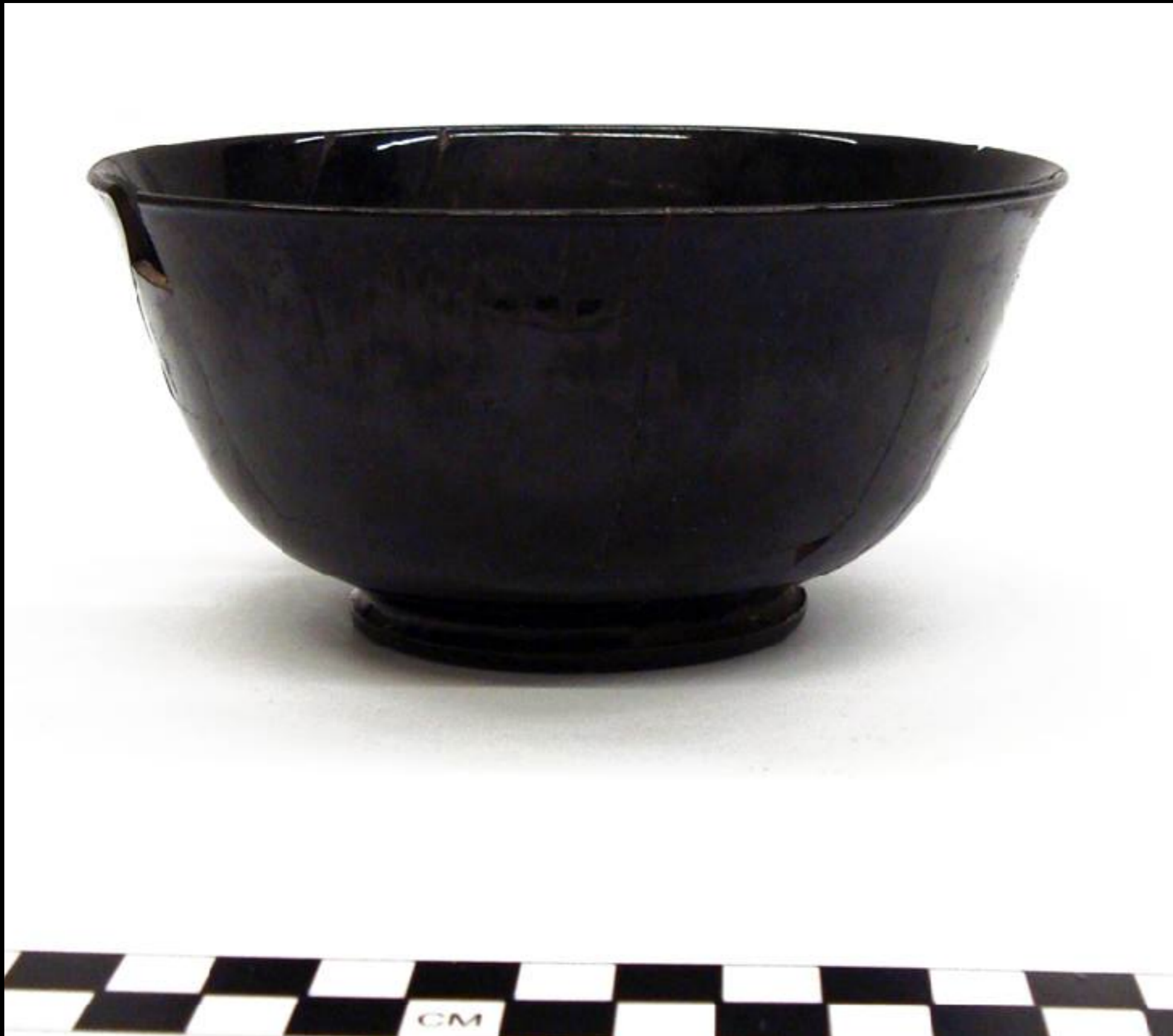
English Lead Glazed Earthenware "Jackfield" Punch Bowl Recovered from the Three Cranes Tavern Privy, Charlestown, Massachusetts, Burned by the British 17 June, 1775