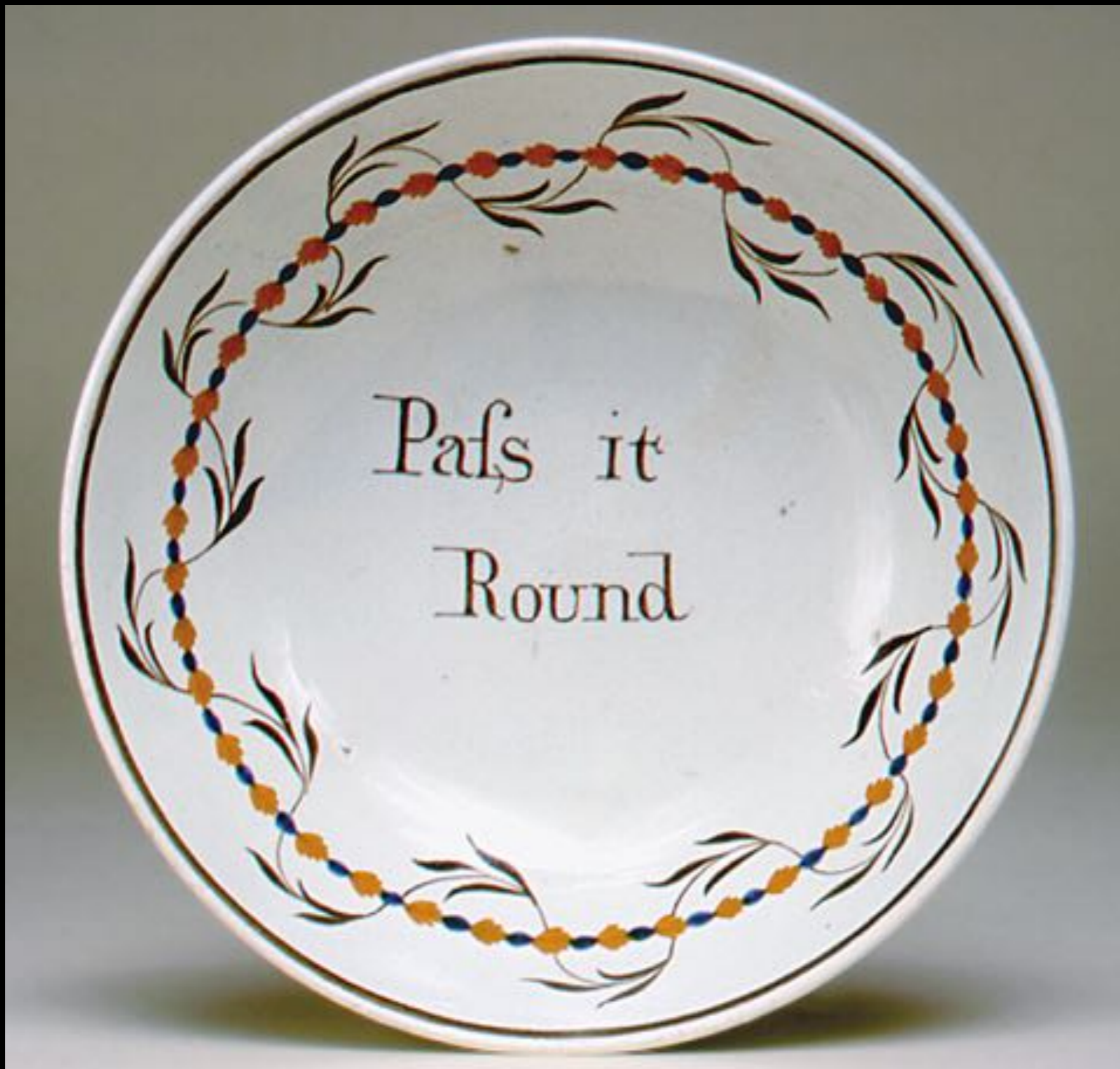
English Lead Glazed Earthenware Punch Bowl c. 1785 - 1790 (Five Colleges & Historic Deerfield Museum Consortium)