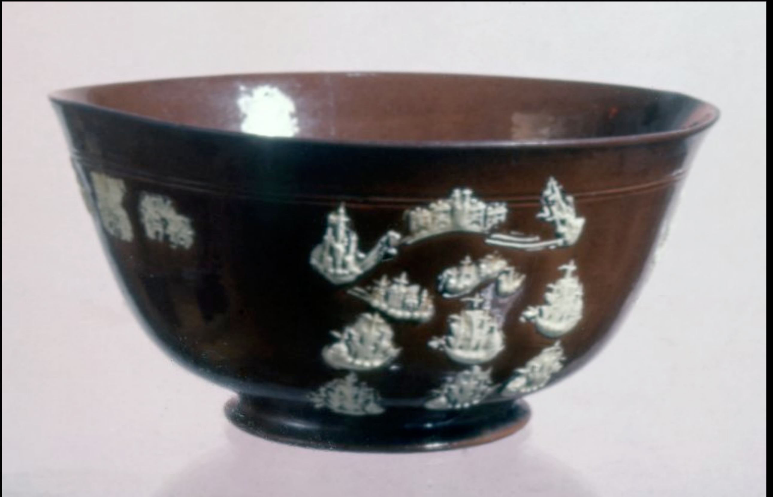
English Lead Glazed Earthenware Punch Bowl from Asbury Ware “YE PRID OF SPAIN HUMBLLED BY ADMIRAL VERNON HE TOOK PORTOBELLO WITH SIX SHIPS ONLY NOV YE 22 1739” (The British Museum)