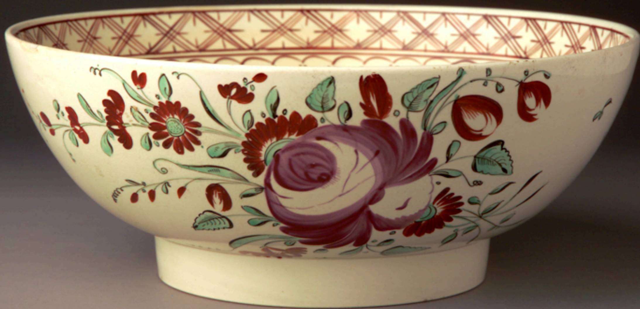
English Lead Glazed Earthenware Punch Bowl from Staffordshire