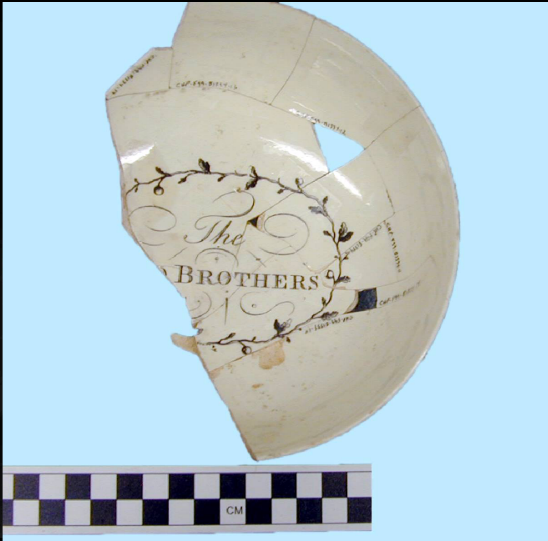
English Lead Glazed Earthenware Punch Bowl Found in New York Marked "The — — BROTHERS"