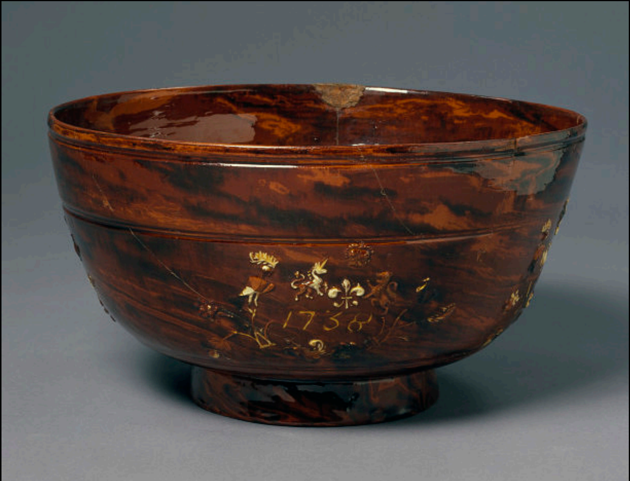
English Lead - Glazed Earthenware Punch Bowl with Mould - Applied Decorations from Staffordshire