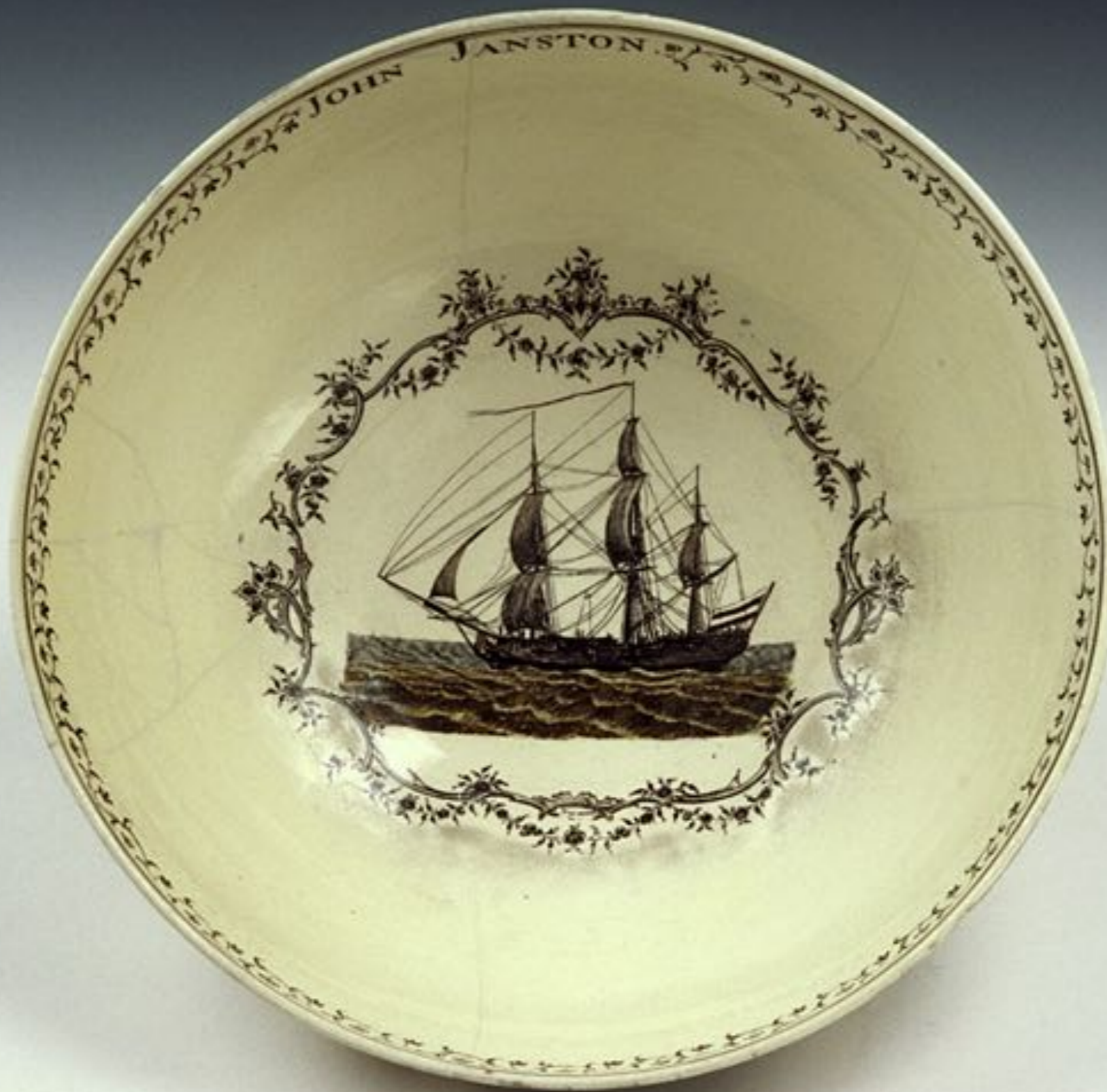
English Lead Glazed Earthenware / Creamware Punch Bowl c. 1780 (Five Colleges & Historic Deerfield Museum Consortium)