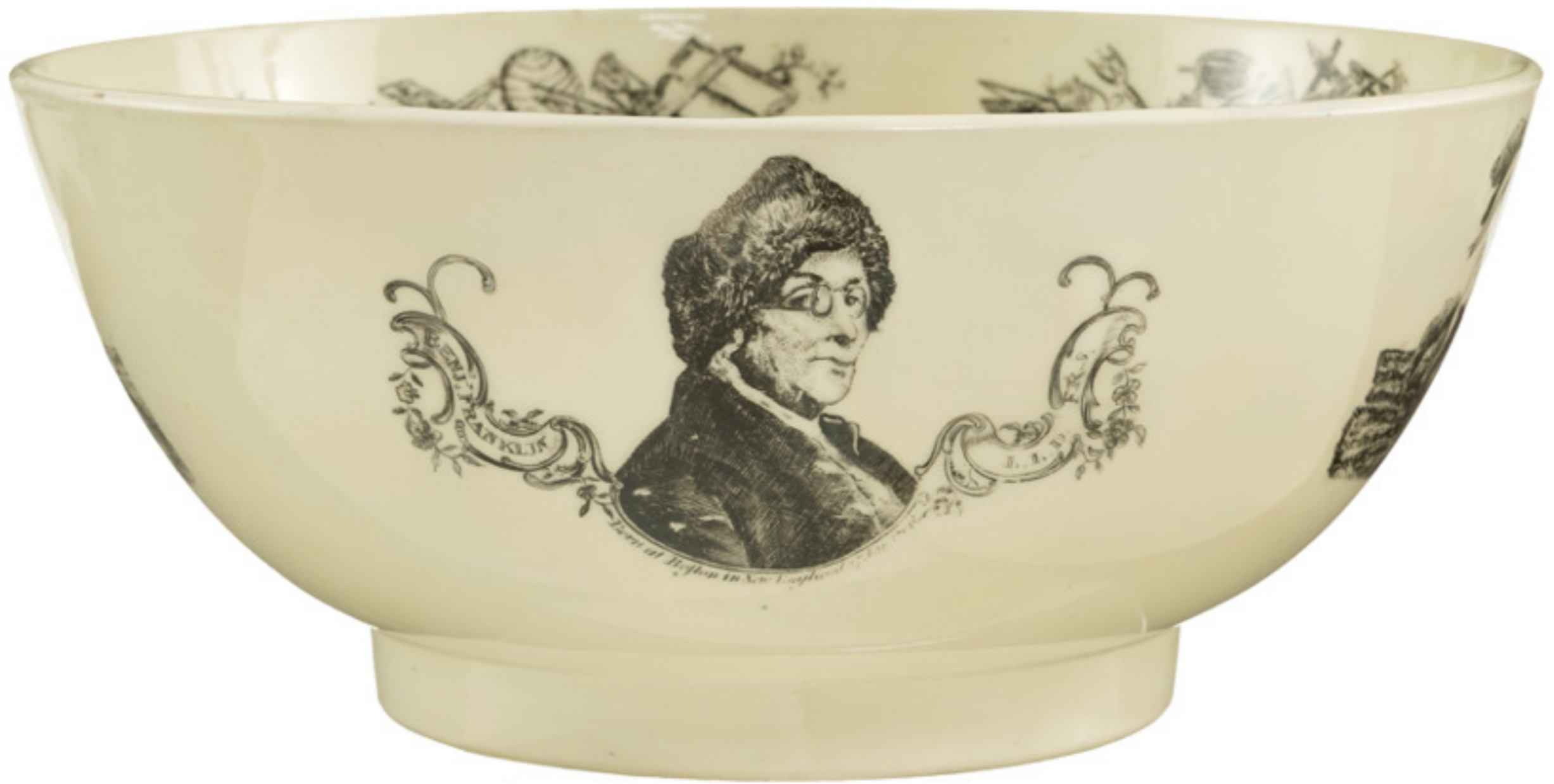
English Lead Glazed Earthenware / Creamware Punch Bowl from Liverpool Depicting Franklin & Washington 18th Century