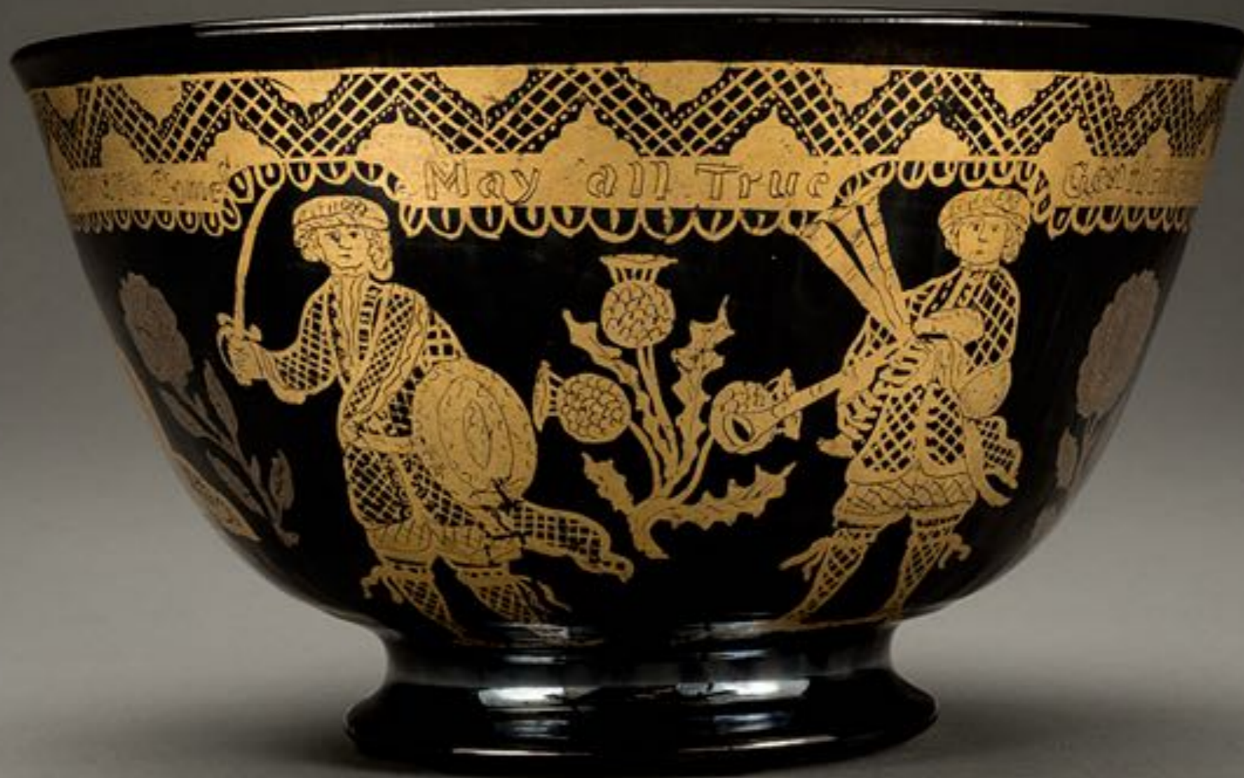
English Lead Glazed Earthenware "Blackware" Punch Bowl from Staffordshire c. 1766 (Five Colleges & Historic Deerfield Museum Consortium)