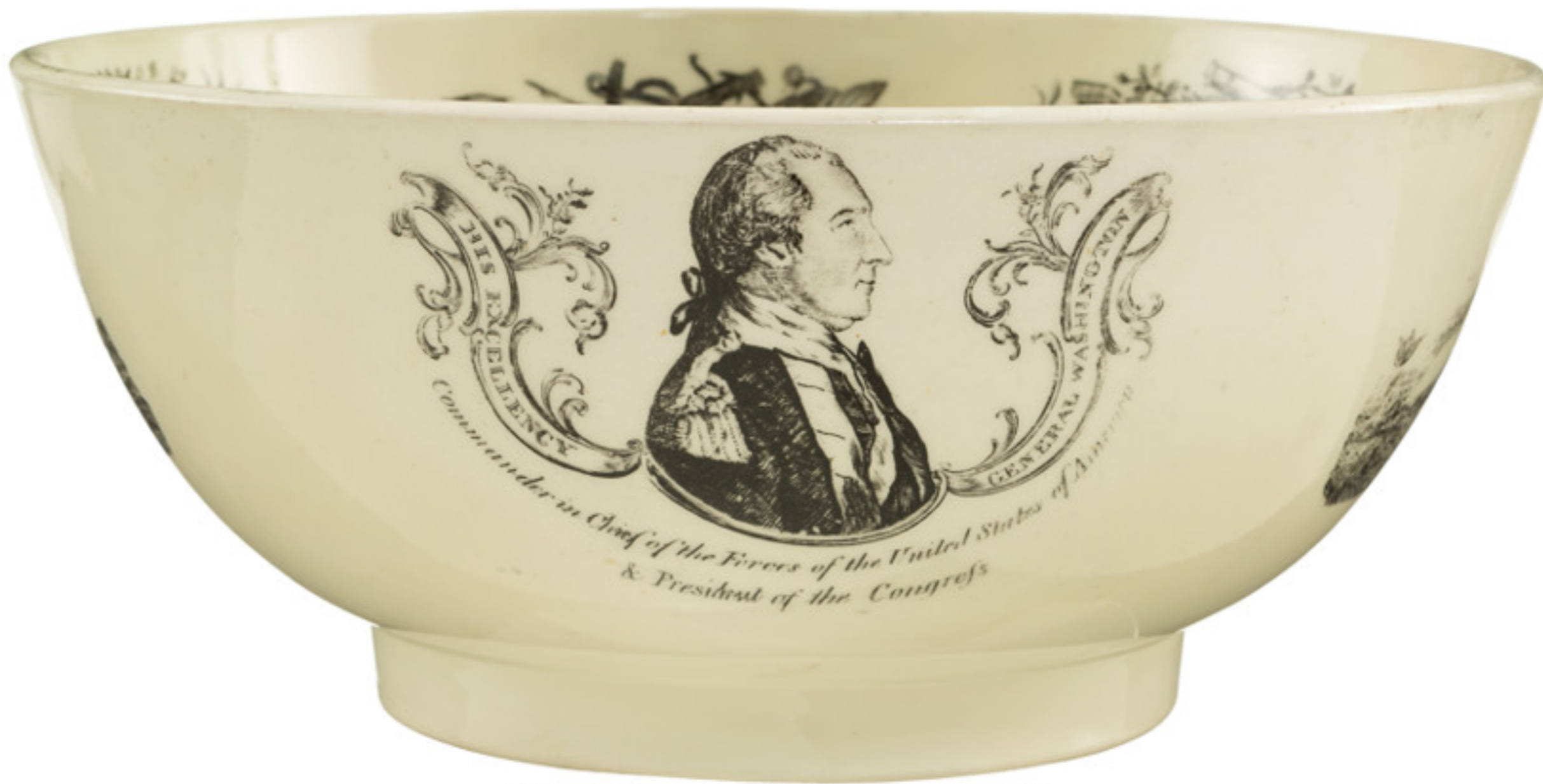
English Lead Glazed Earthenware / Creamware Punch Bowl from Liverpool Depicting Franklin & Washington 18th Century