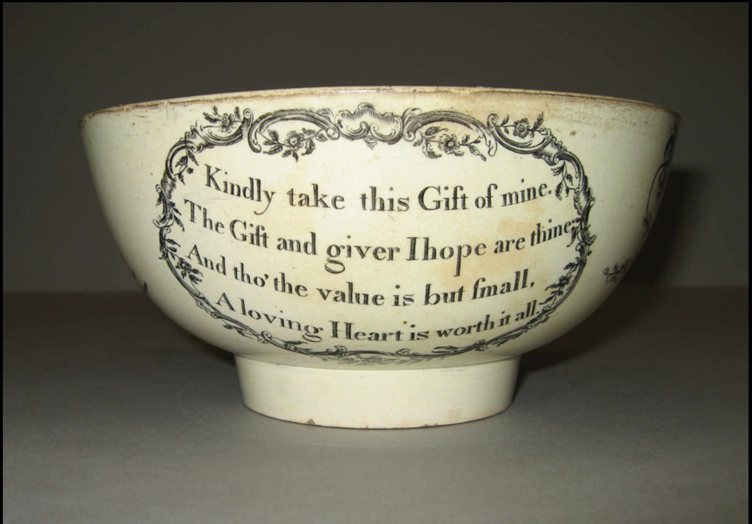
English Lead Glazed Earthenware / Creamware Punch Bowl Marked "COL. TARLETON."