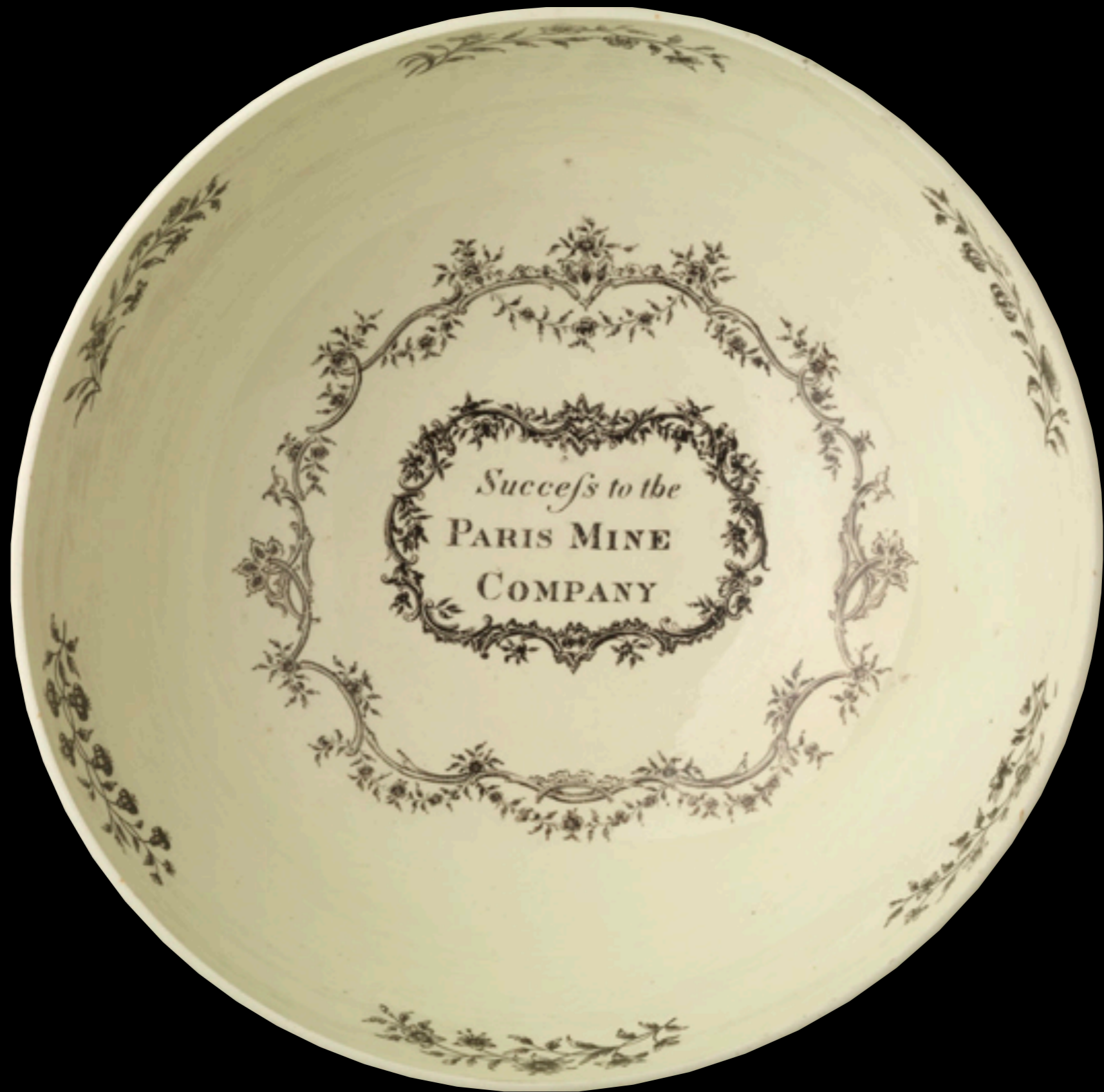
English Lead Glazed Creamware Punch Bowl from Staffordshire Depicting the Etruria Factory or Paris Mining Company by Wedgwood's Etruria Factory c. 1774 - 1784