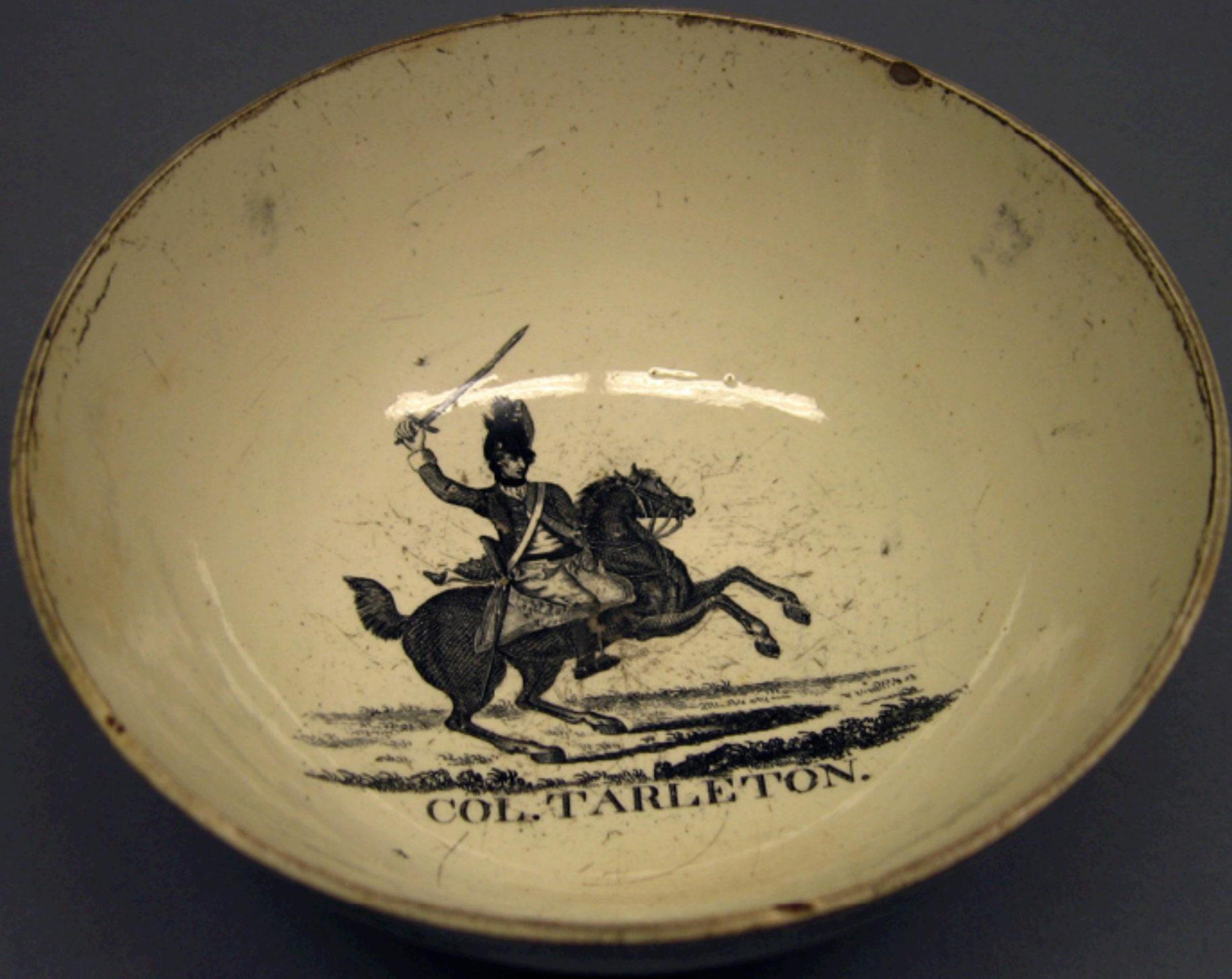
English Lead Glazed Earthenware / Creamware Punch Bowl Marked "COL. TARLETON."