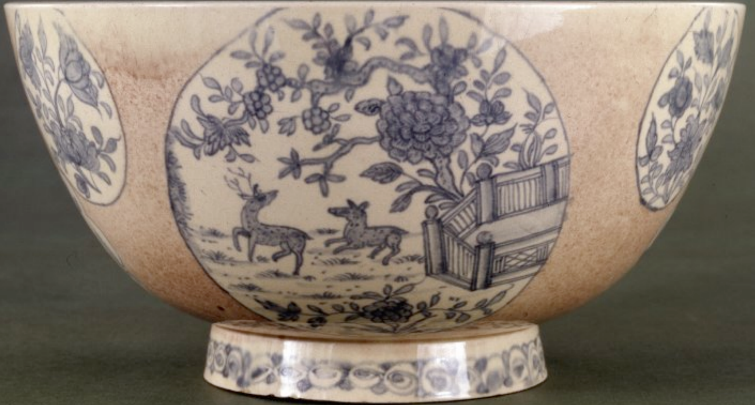
English Lead Glazed Earthenware Punch Bowl from Turnstall by Enoch Booth 1743 (The British Museum)