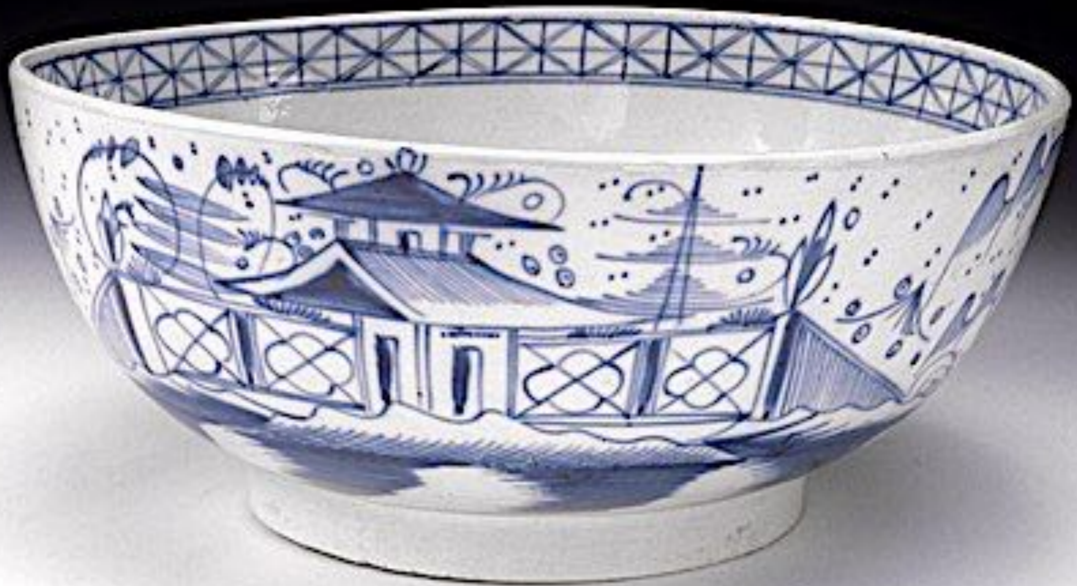
English Lead Glazed Earthenware Punch Bowl c. 1780 - 1800 (Five Colleges & Historic Deerfield Museum Consortium)