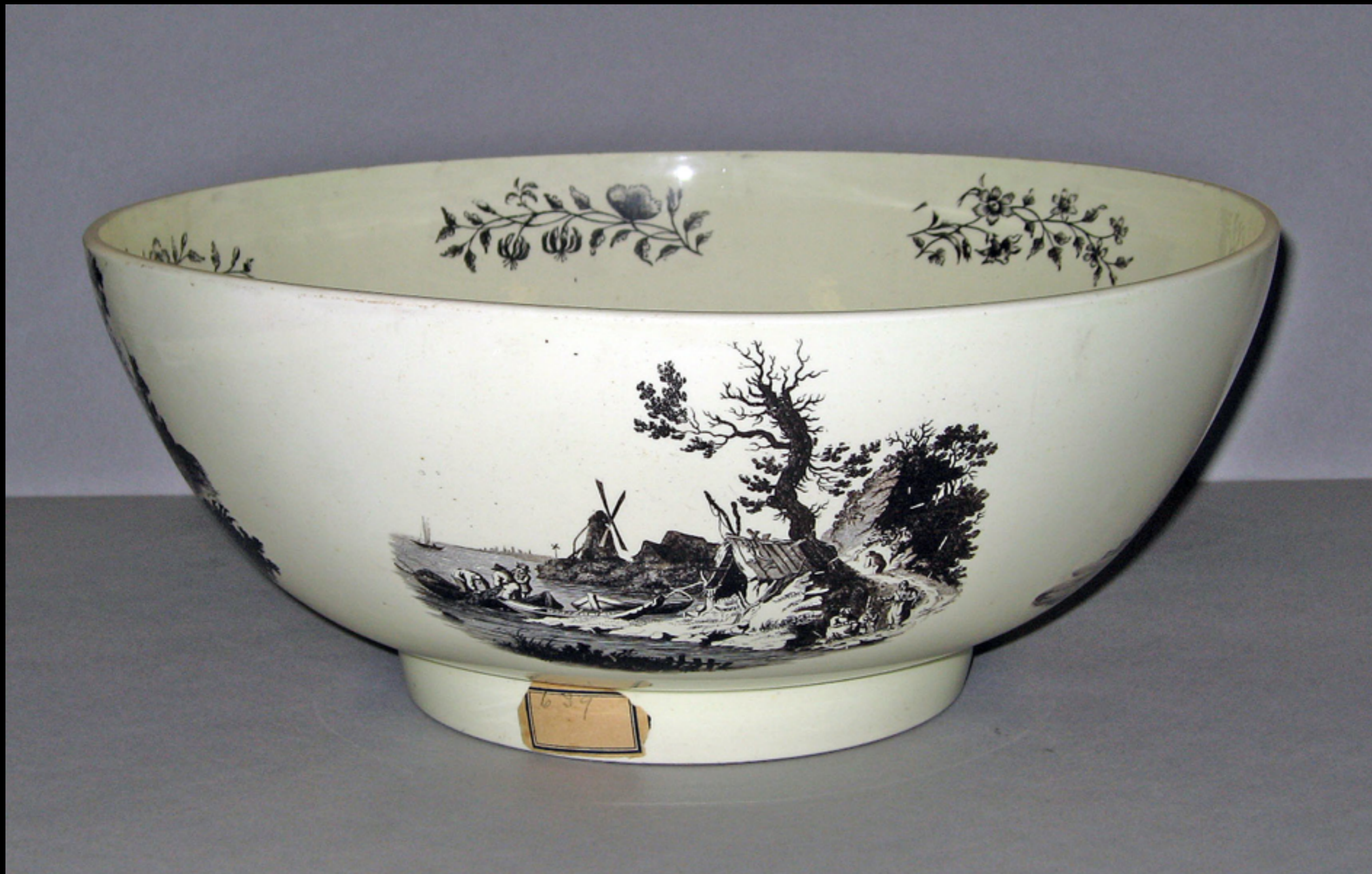
English Lead Glazed Creamware Punch Bowl from Staffordshire Depicting the Etruria Factory or Paris Mining Company by Wedgwood's Etruria Factory c. 1774 - 1784 (Winterthur)