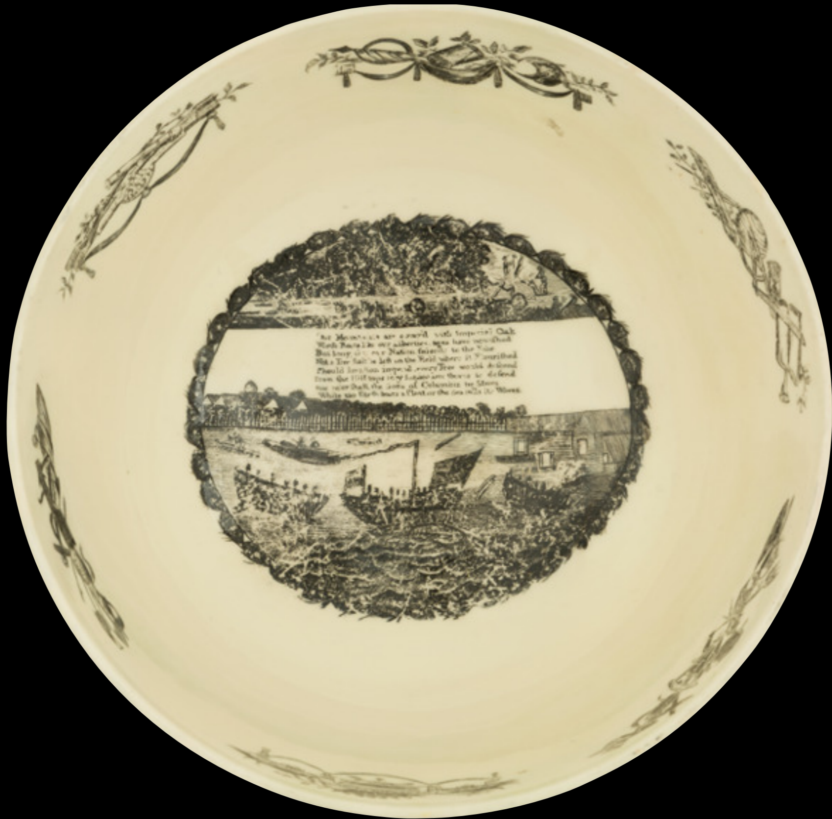
English Lead Glazed Earthenware / Creamware Punch Bowl from Liverpool Depicting Franklin & Washington 18th Century (Heritage Auctions)