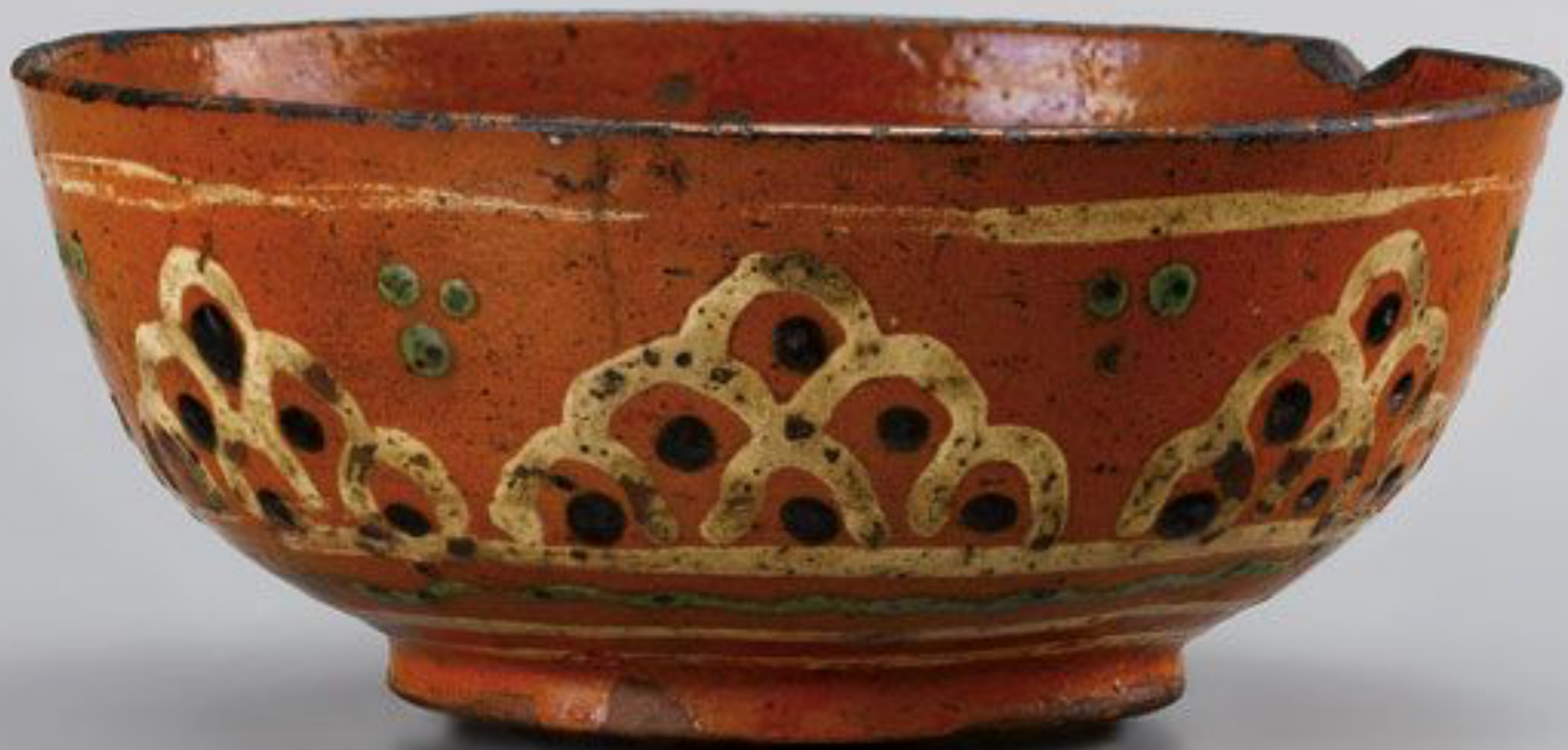
American Lead Glazed Earthenware Punch Bowl from Alamance County, North Carolina