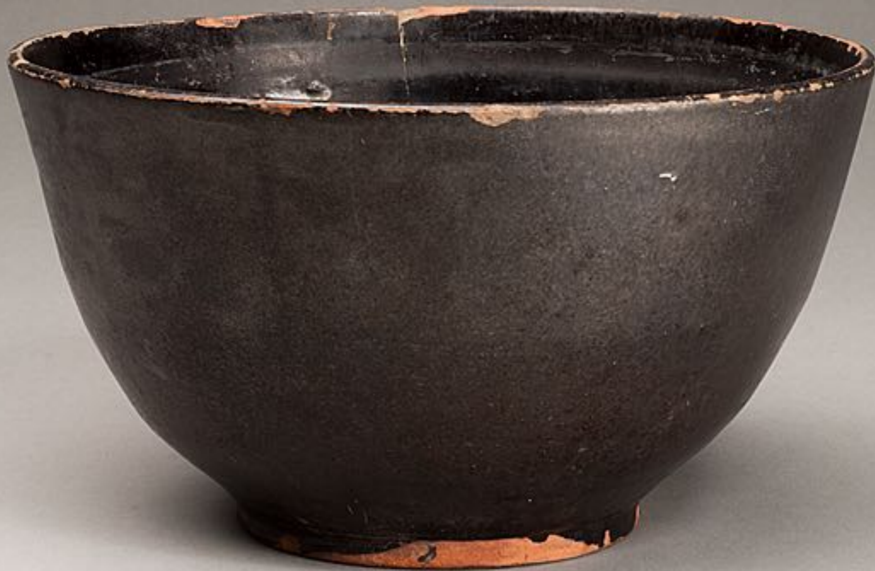
American Lead Glazed Earthenware Punch Bowl from New England c. 1780 - 1810 (Five Colleges & Historic Deerfield Museum Consortium)