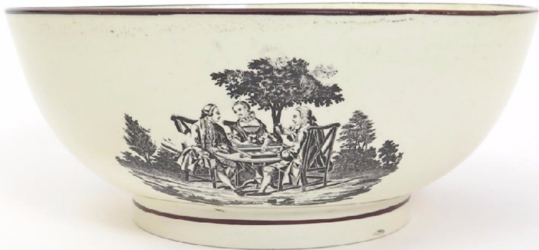
English Lead Glazed Earthenware / Creamware Punch Bowl Late 18th Century (Woolley & Wallace)