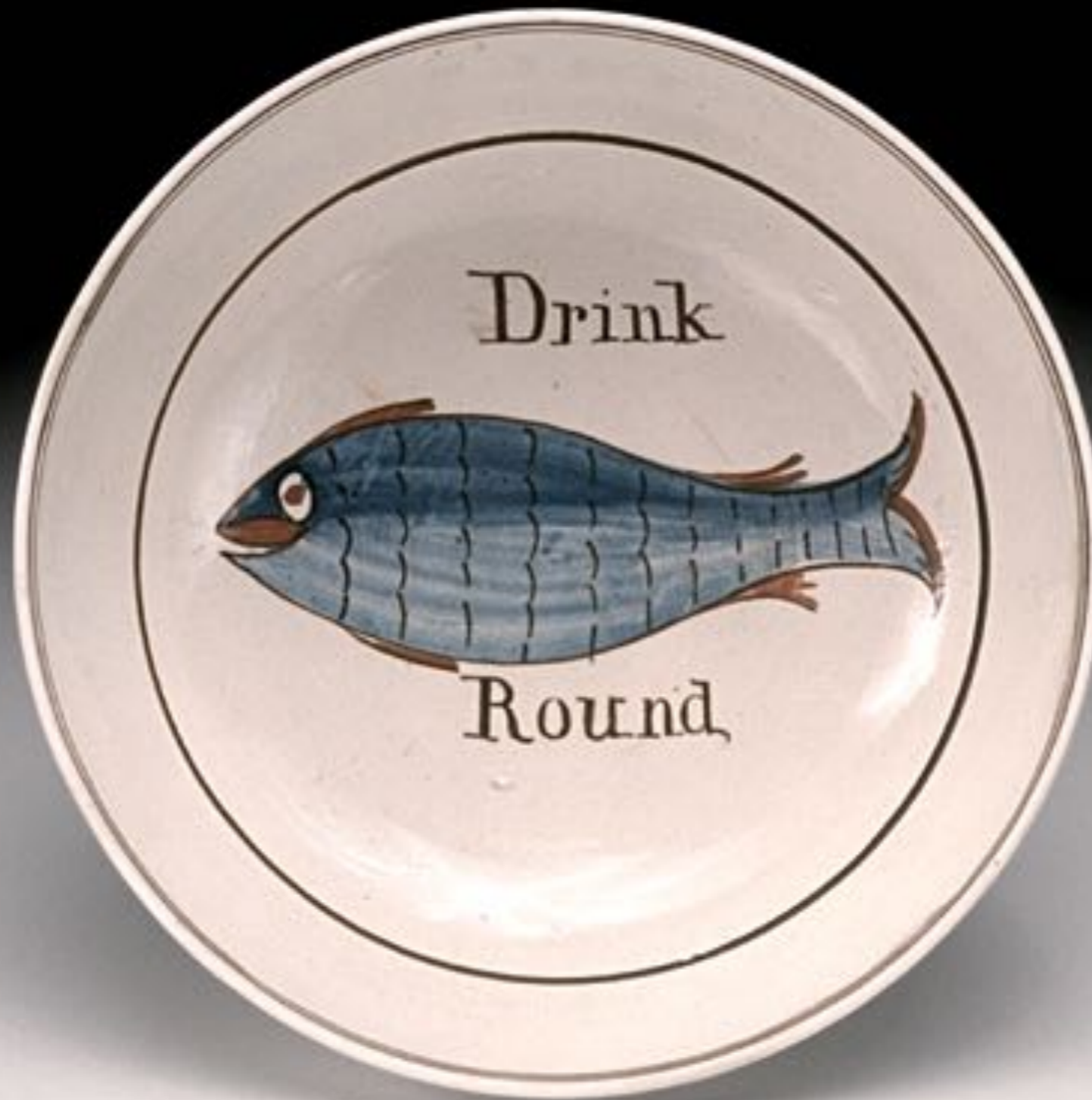
English Lead Glazed Earthenware Punch Bowl c. 1780 (Five Colleges & Historic Deerfield Museum Consortium)