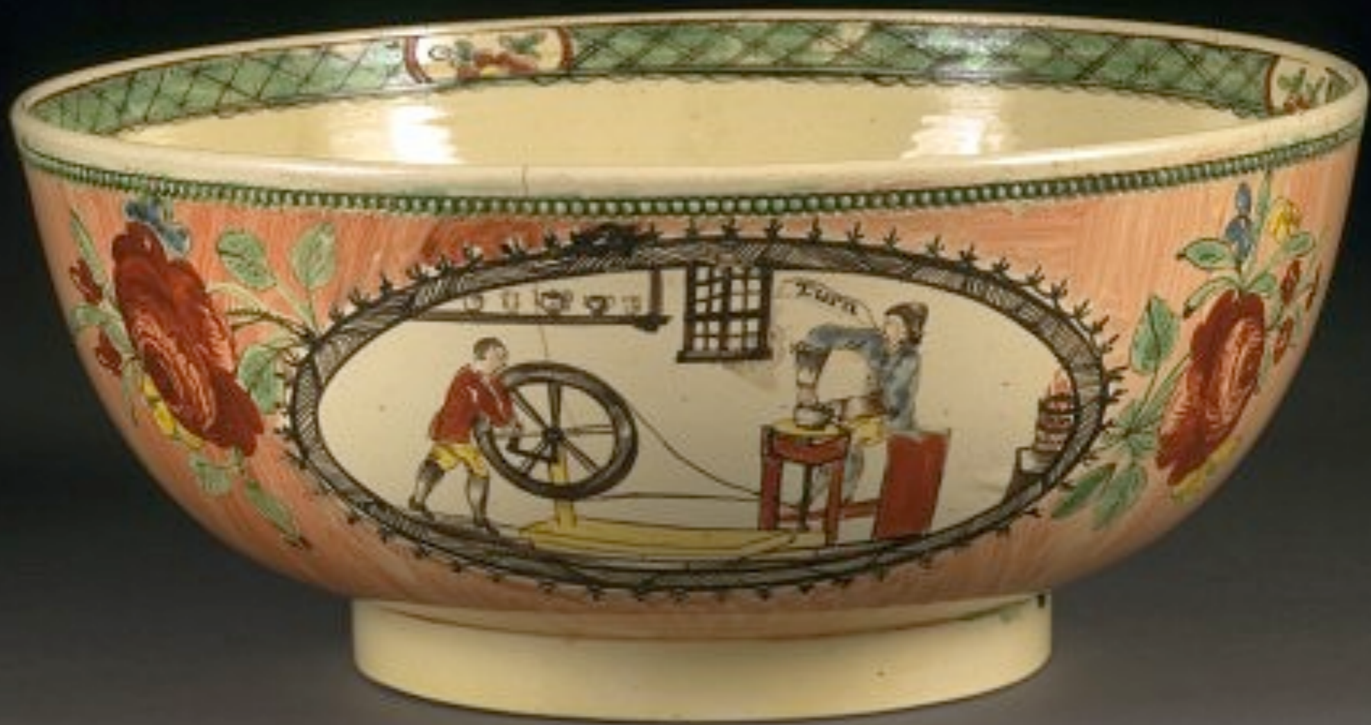
English Lead Glazed Creamware Punch Bowl with Enamel Decoration Depicting a Pottery Factory from Leeds