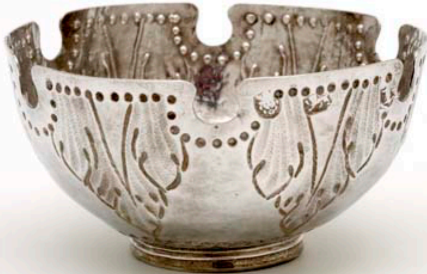
English Miniature Silver Punch Bowl / Monteith c. 1696 (Museum of London)