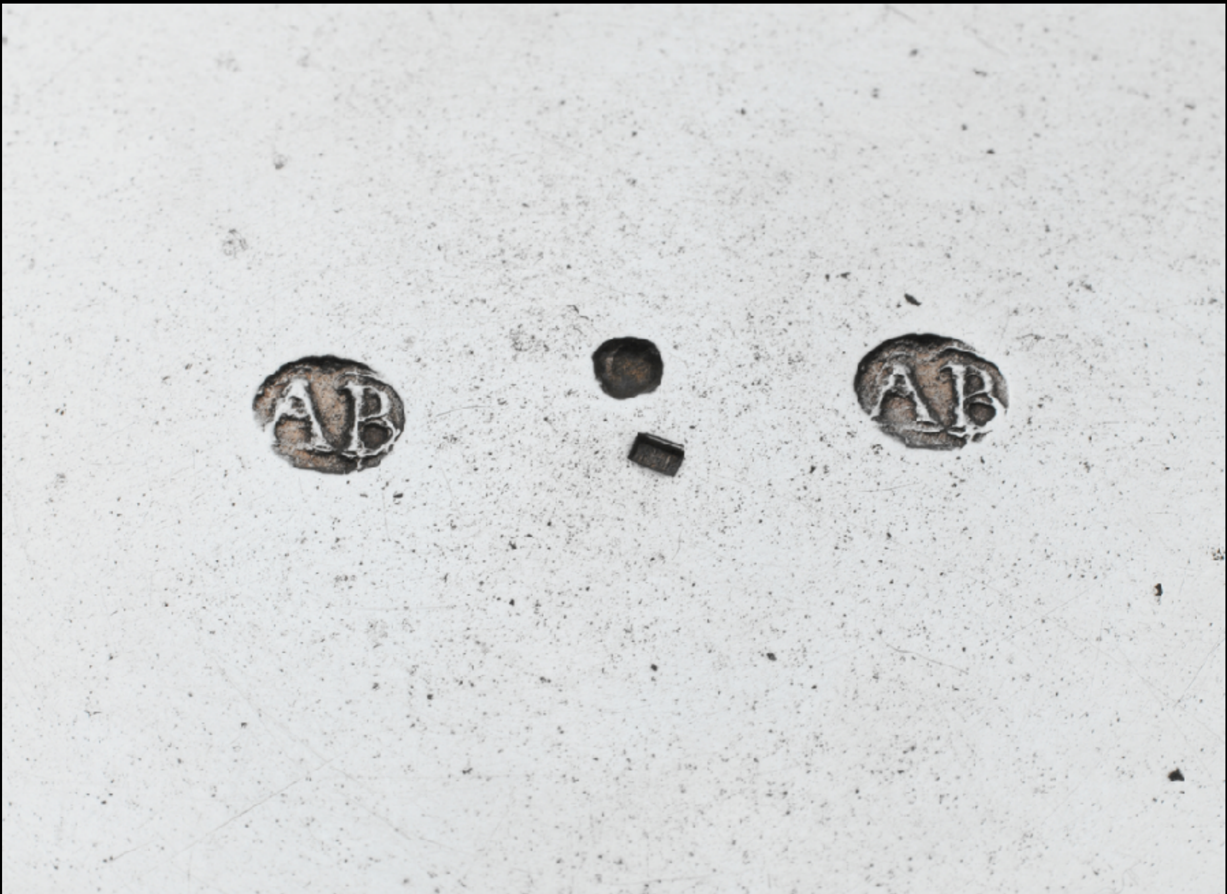
American Silver Punch Bowl from New York by Adrian Bancker c. 1750 (Metropolitan Museum of Art)