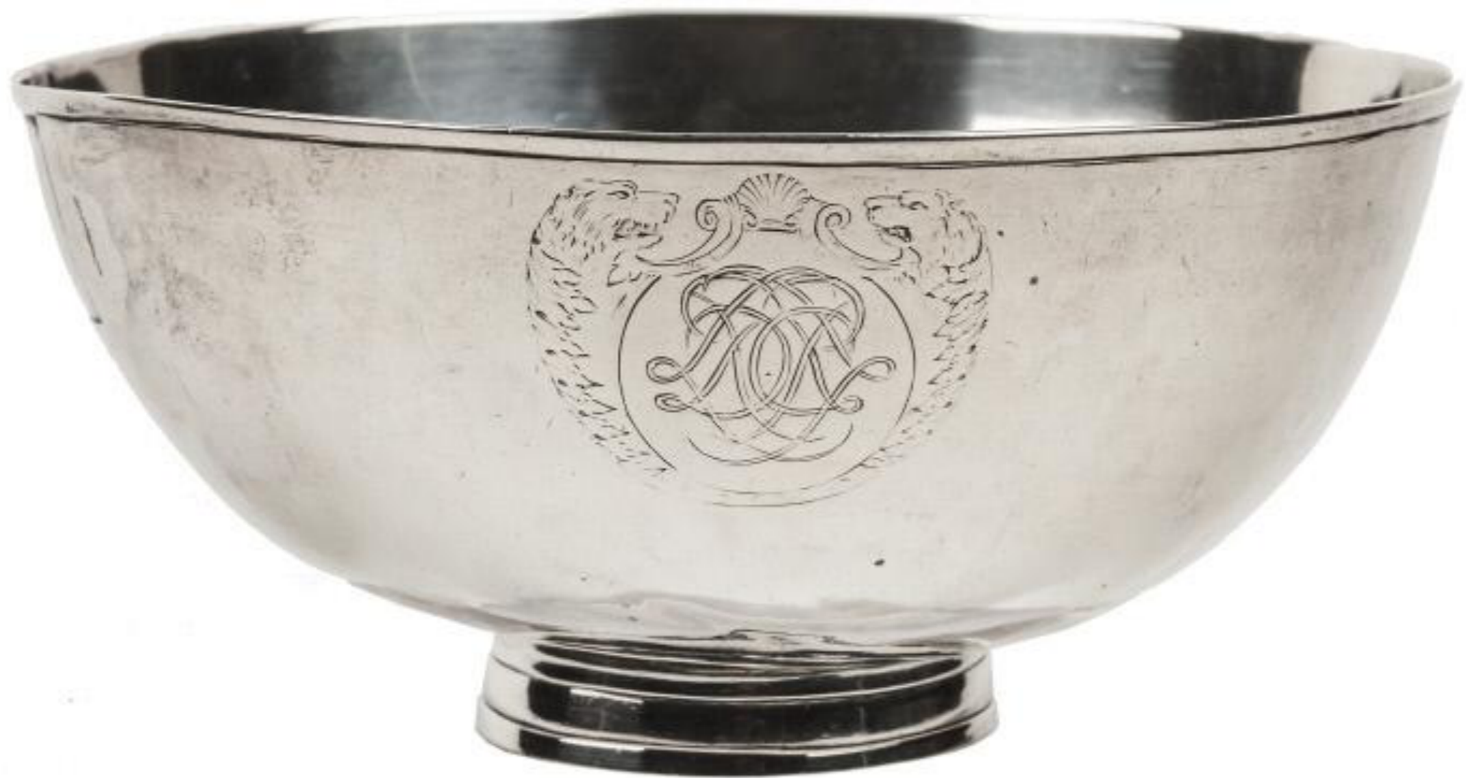
American Silver Punch Bowl Owned by the Delancy Family of New York