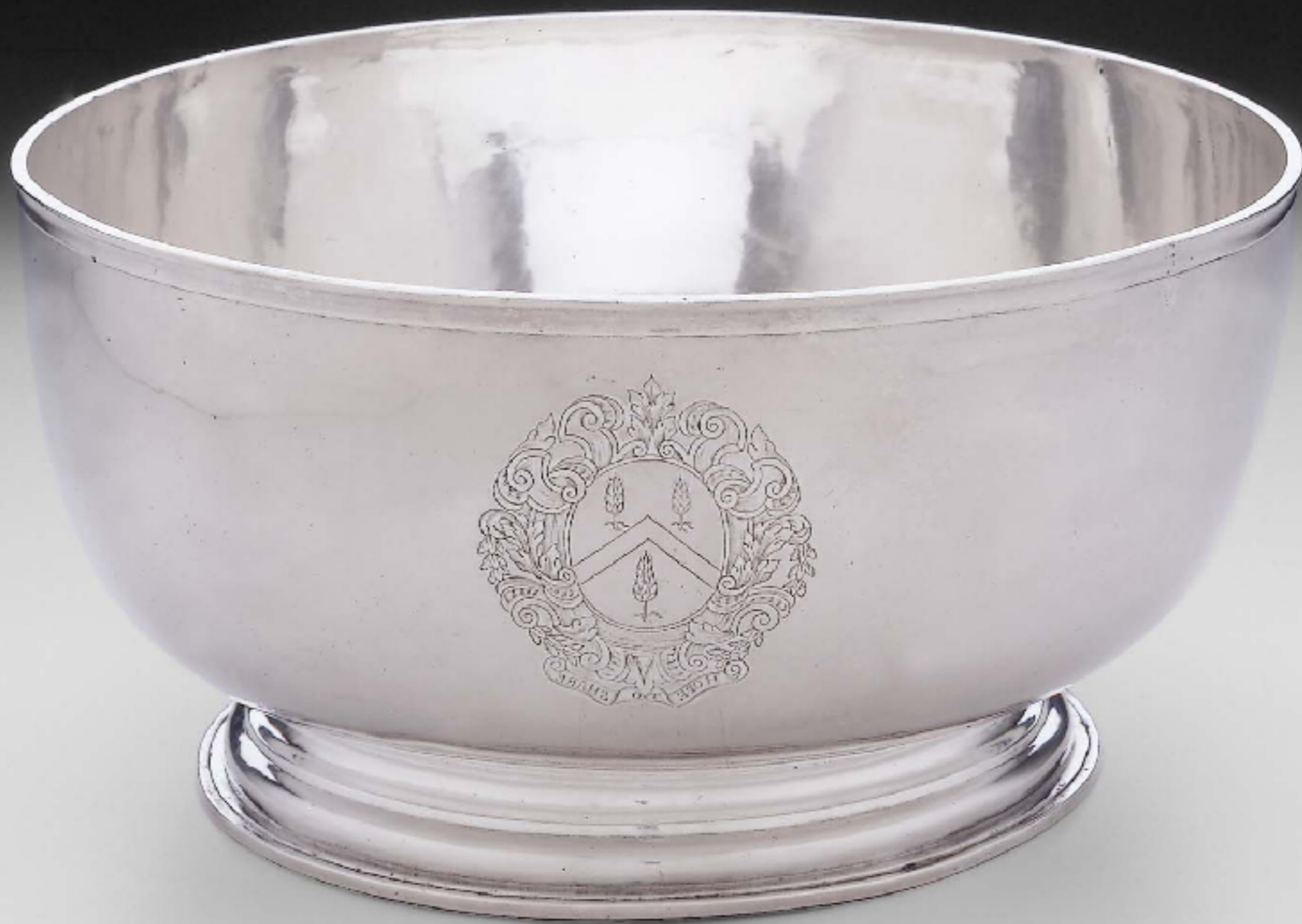
American Silver Punch Bowl from Massachusetts by John Coney of Boston c. 1708 - 1709 (Museum of Fine Arts, Boston)