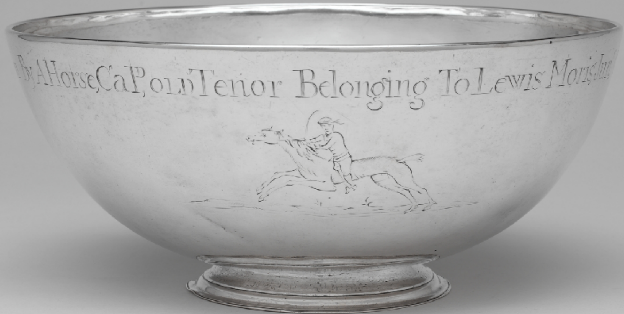
American Silver Punch Bowl / Racing Trophy Likely from New York