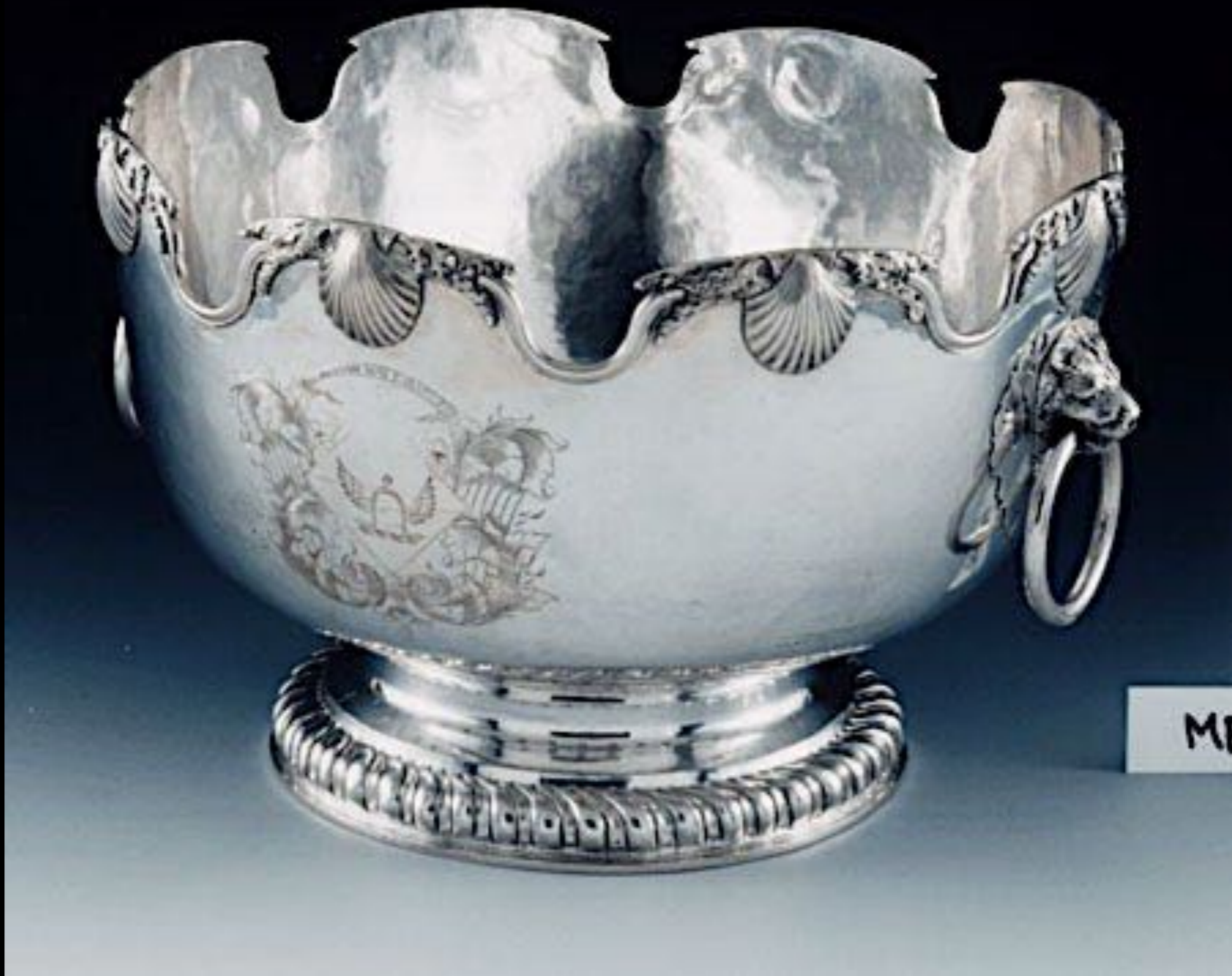
Scottish Silver Punch Bowl / Monteith from Edinburgh