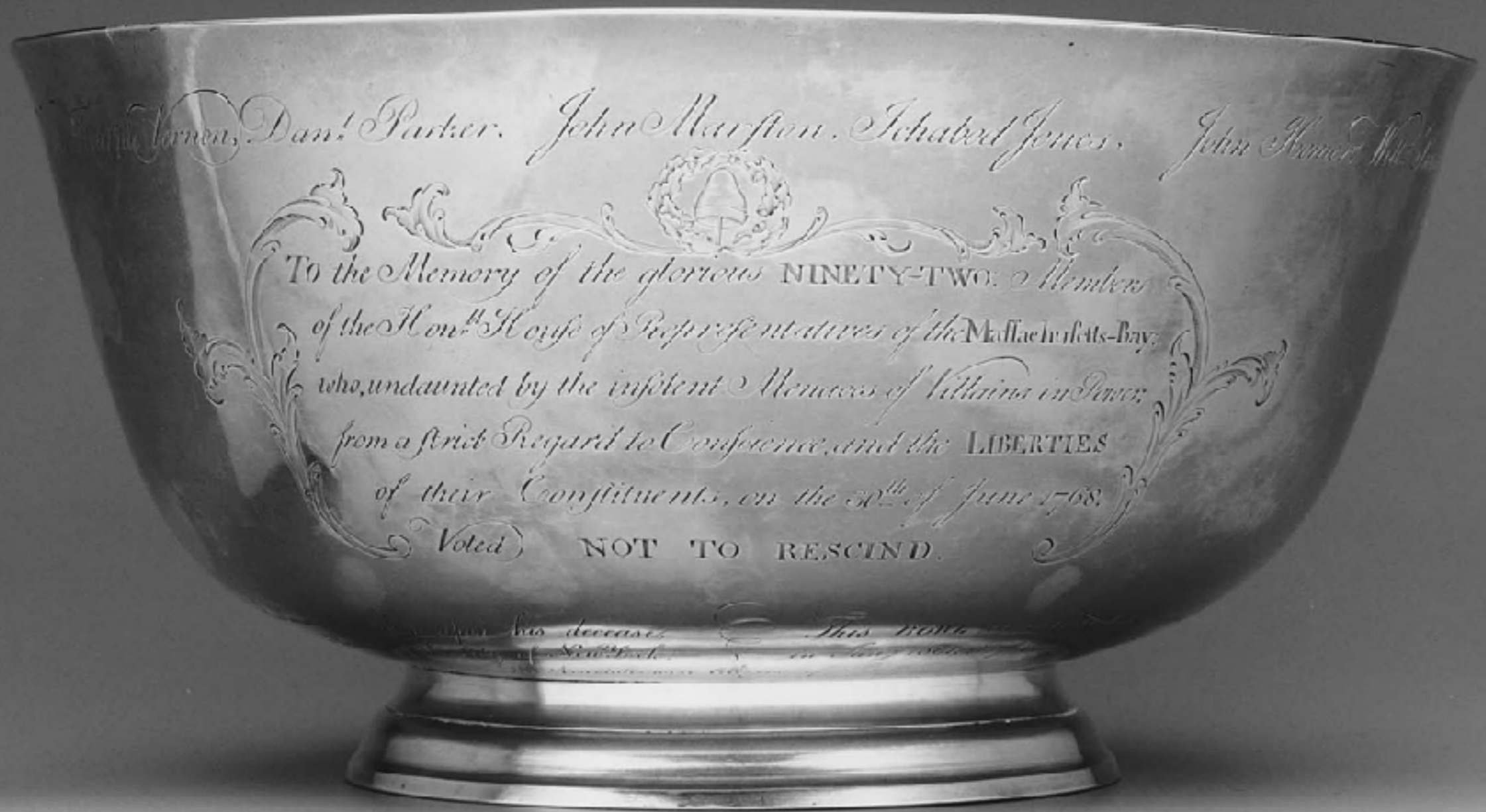
American Silver "Sons of Liberty" Punch Bowl from Massachusetts by Paul Revere of Boston, Massachusetts 1768 (Museum of Fine Arts, Boston)