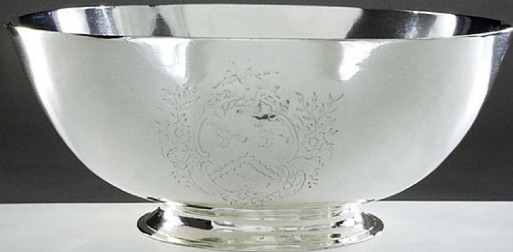
American Silver Punch Bowl from New York by Daniel Christian Fueter c. 1760