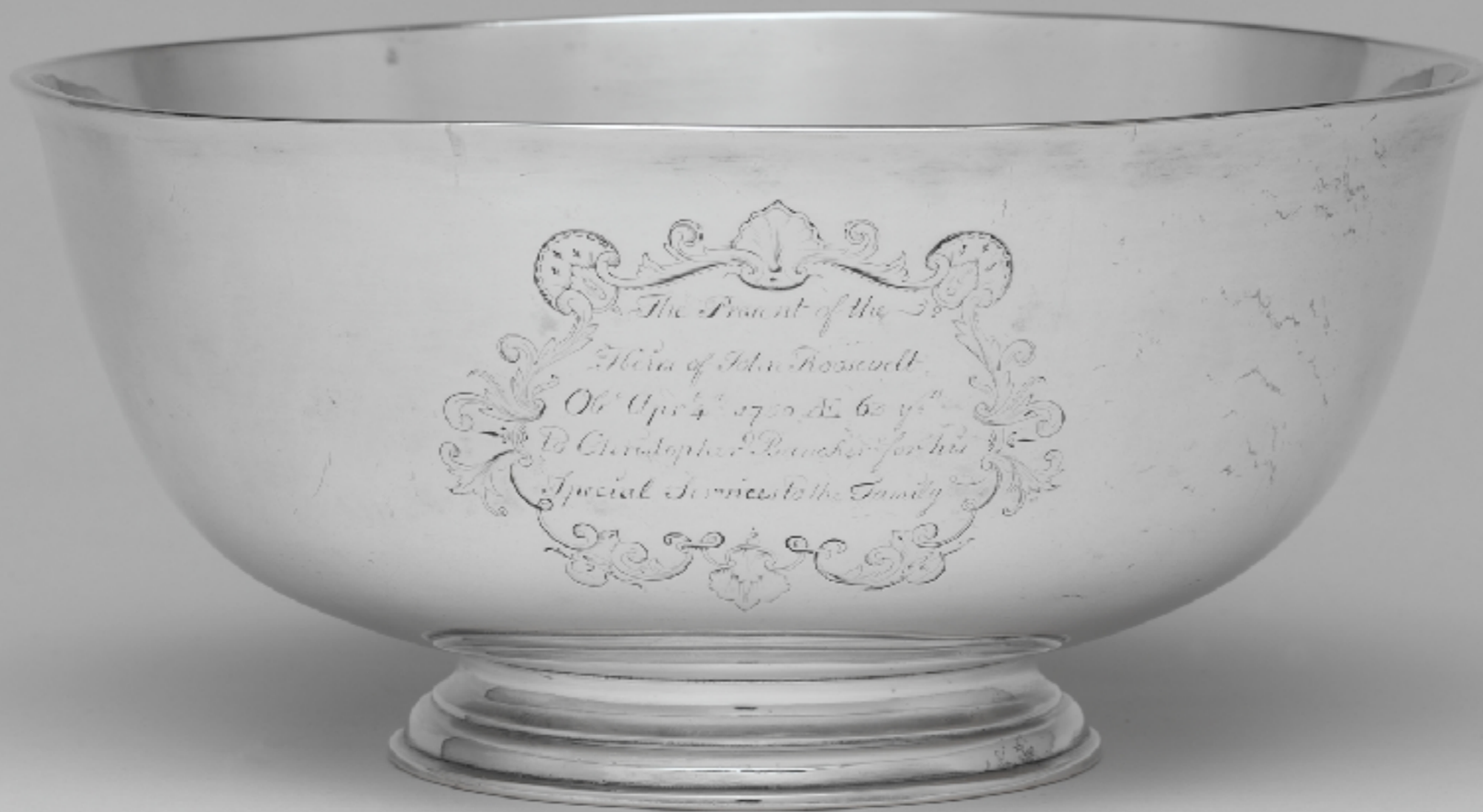
American Silver Punch Bowl from New York by Adrian Bancker c. 1750 (Metropolitan Museum of Art)