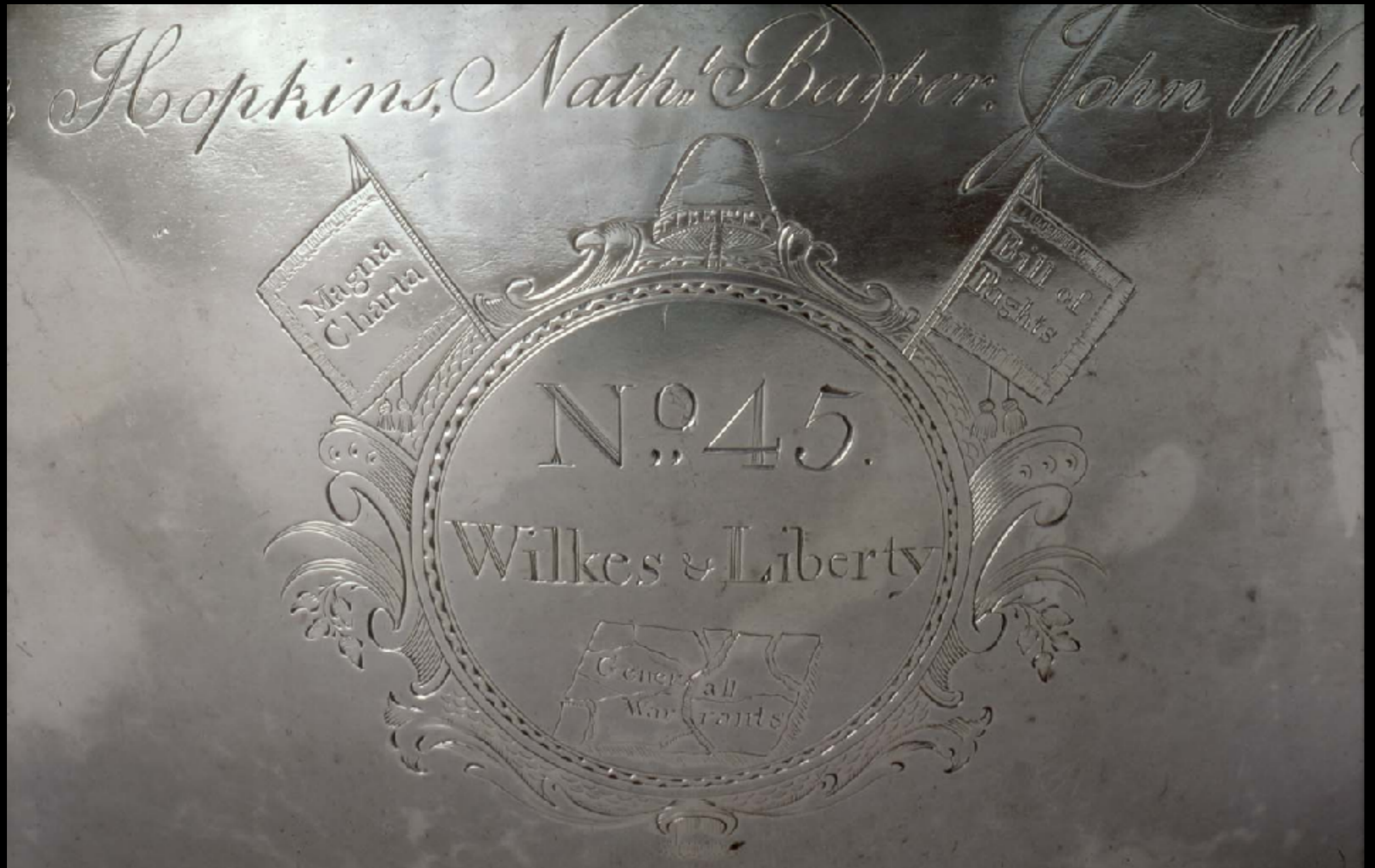
American Silver "Sons of Liberty" Punch Bowl from Massachusetts by Paul Revere of Boston, Massachusetts 1768 (Museum of Fine Arts, Boston)