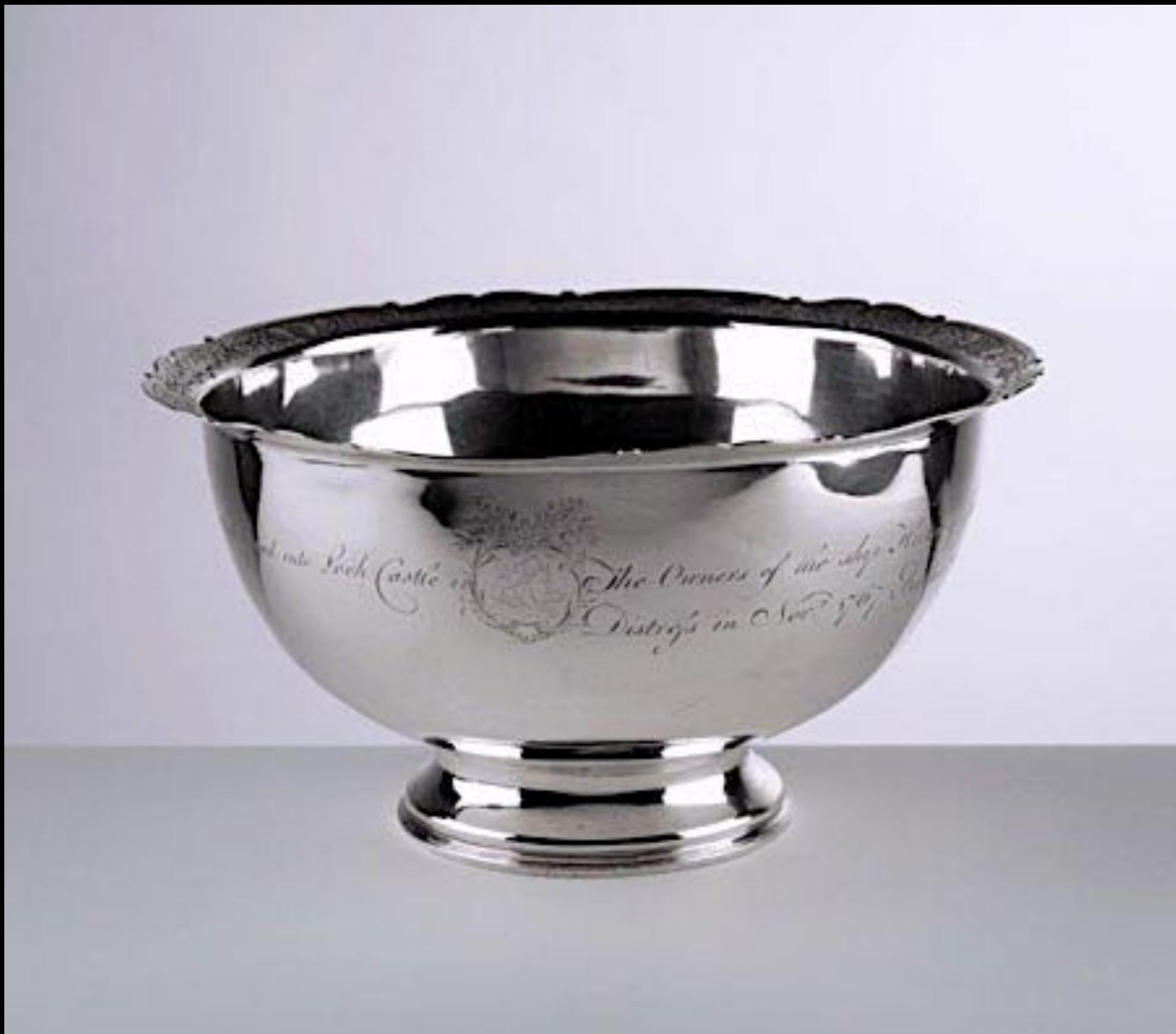
Scottish Silver Punch Bowl from Glasgow by Milne and Campbell c. 1767 (National Museums Scotland)