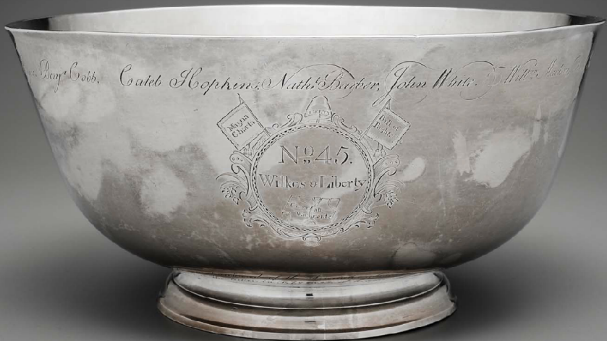
American Silver "Sons of Liberty" Punch Bowl from Massachusetts by Paul Revere of Boston, Massachusetts 1768 (Museum of Fine Arts, Boston)