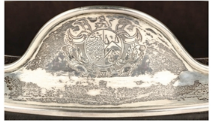
English Silver Mounted Lignum Vitae Wassail Bowl