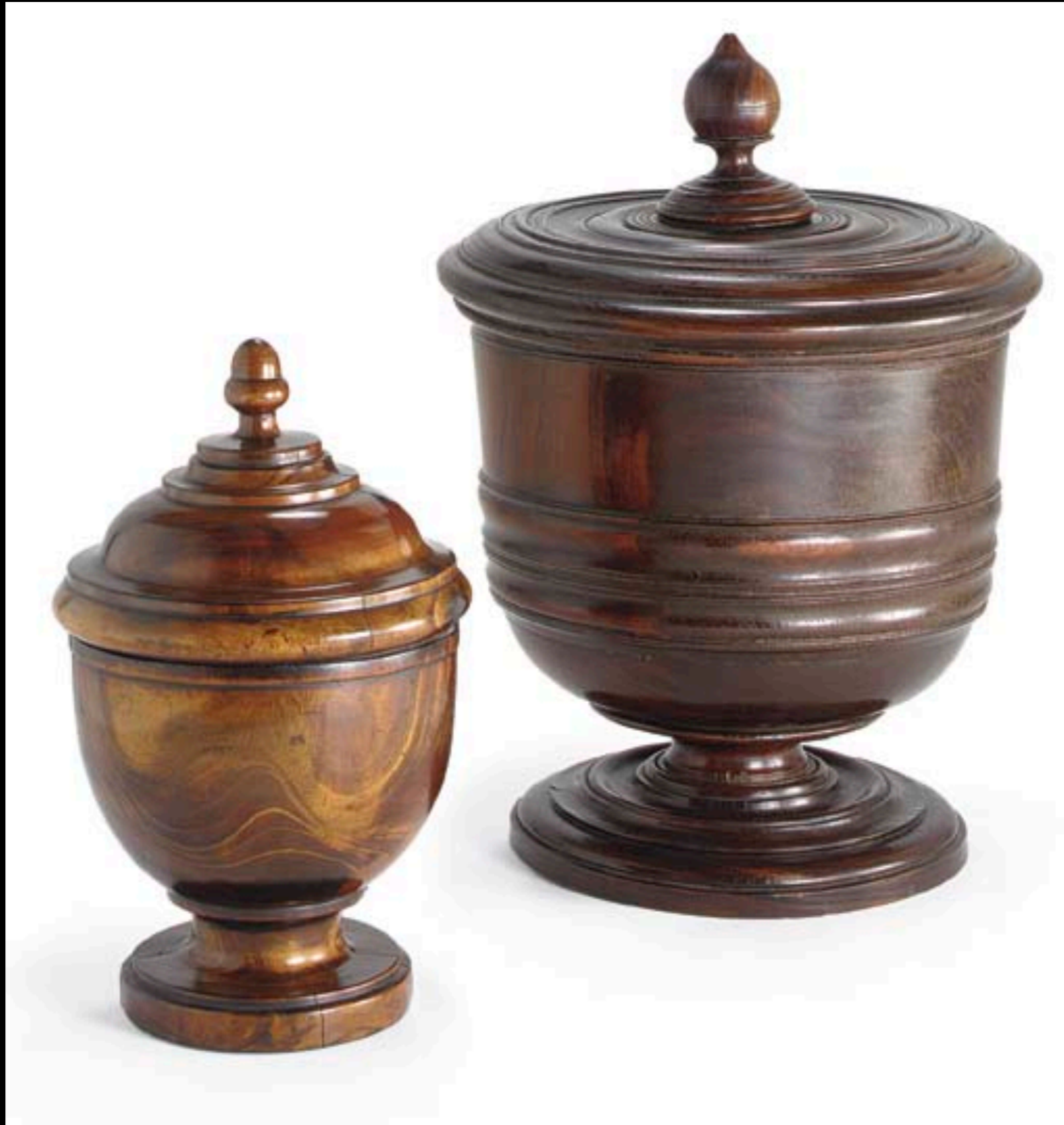
Two English Lignum Vitae Wassail Bowls with Covers Late 17th Century (Christie's)