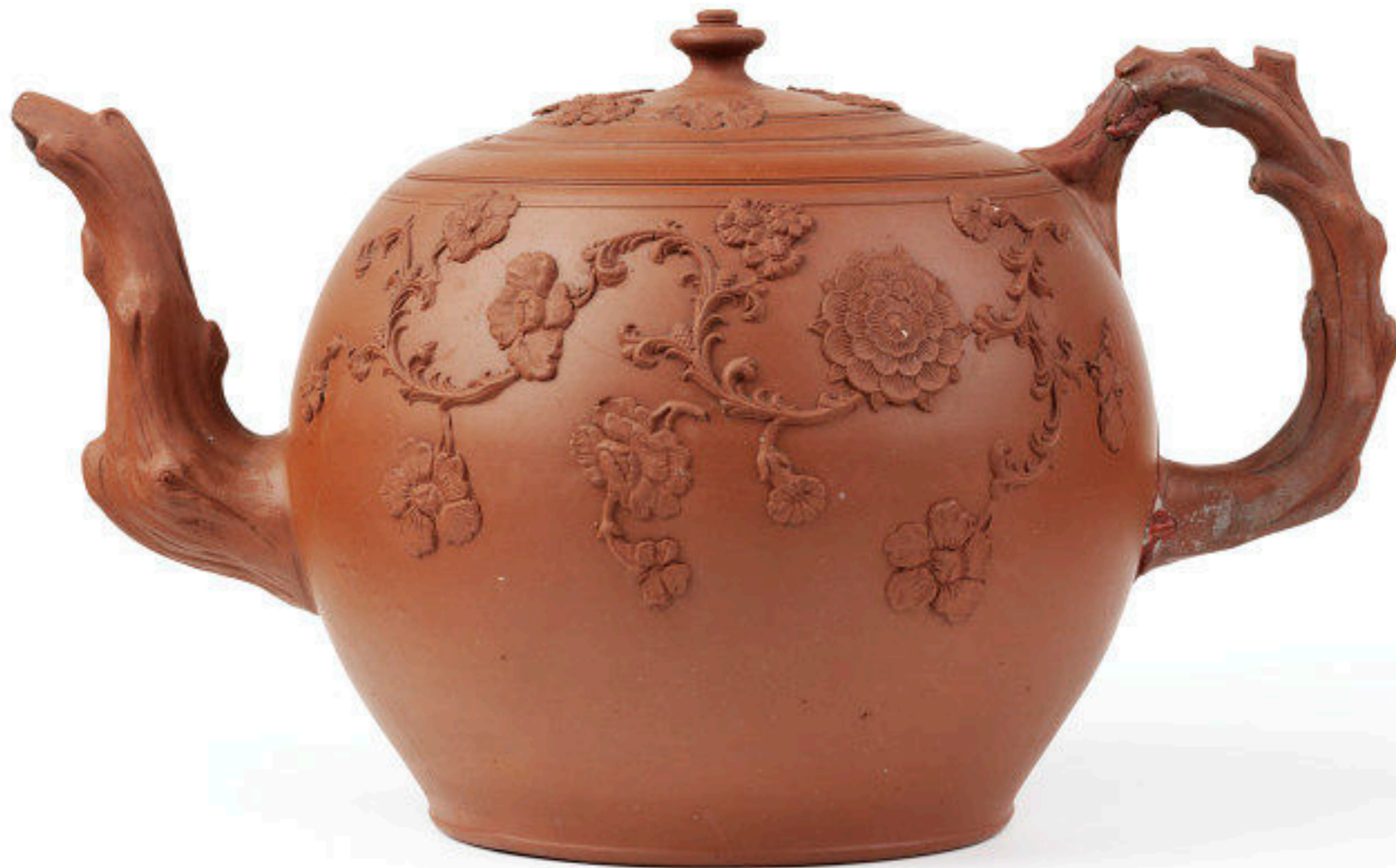
English Red Stoneware Punch Pot from Staffordshire