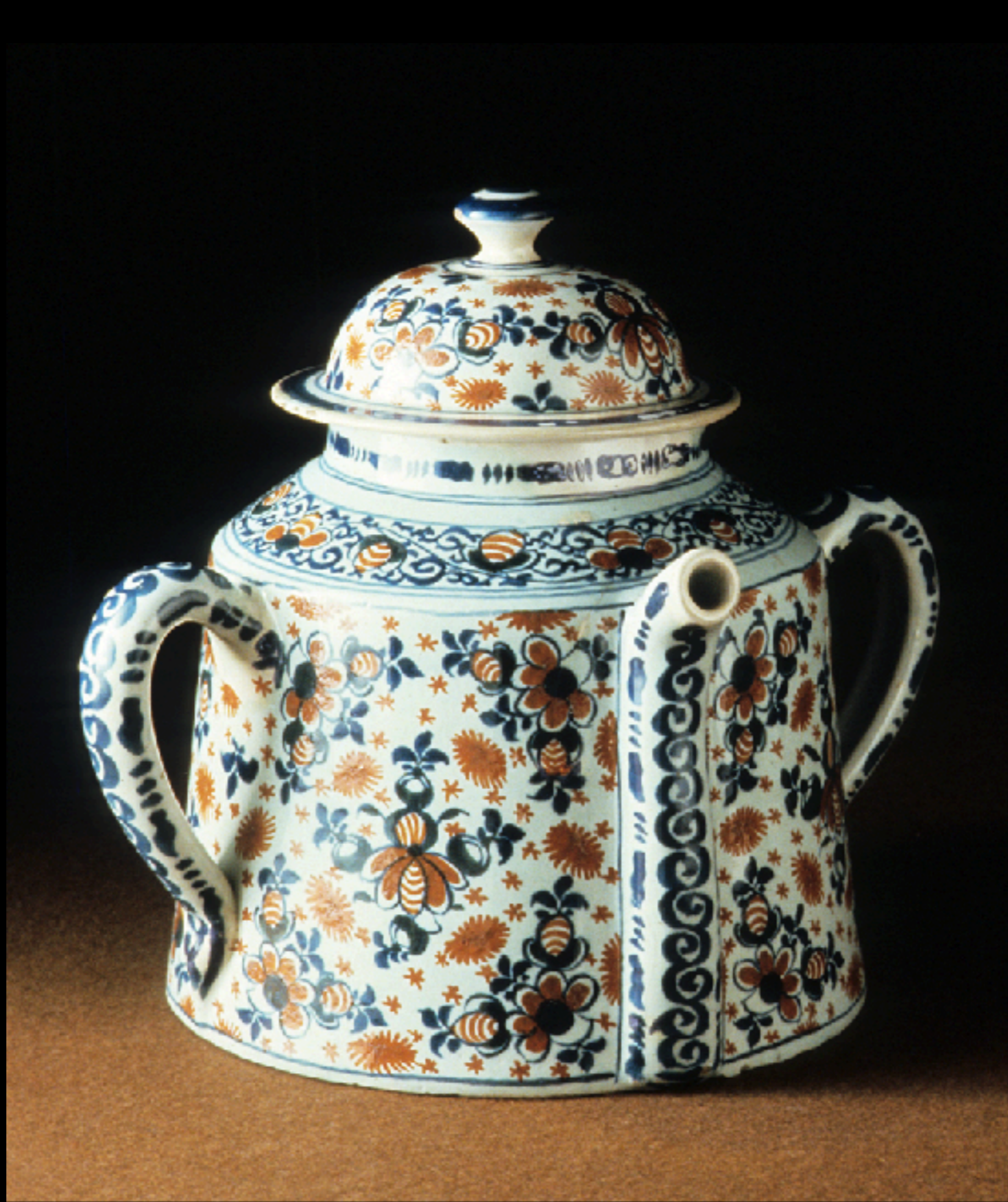
Dutch Tin Glazed Earthenware Posset Pot