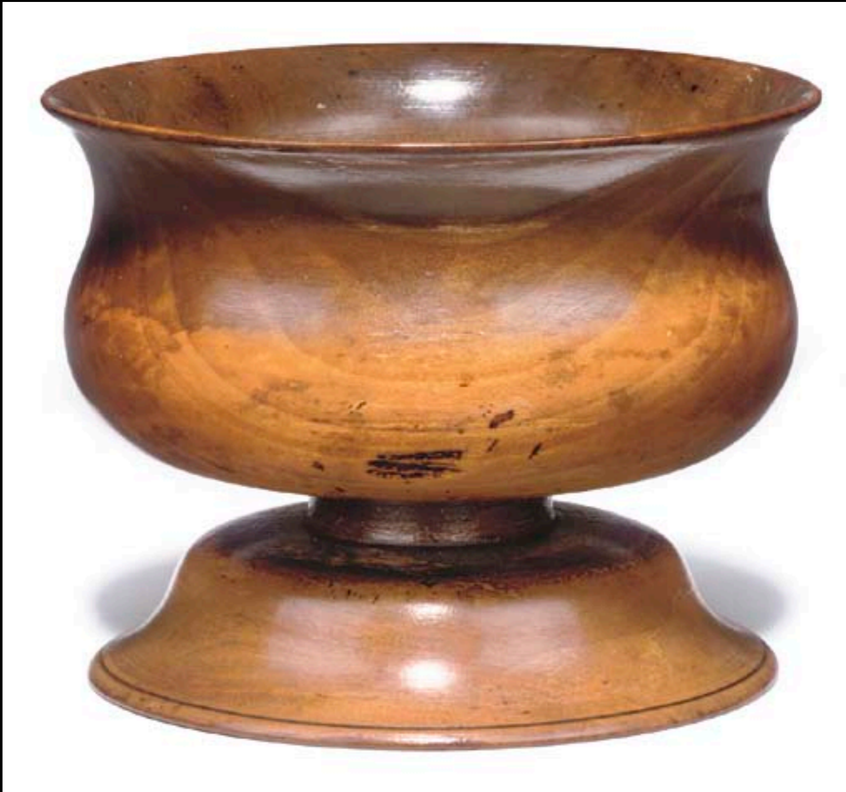
English Posset Cup c. 1620