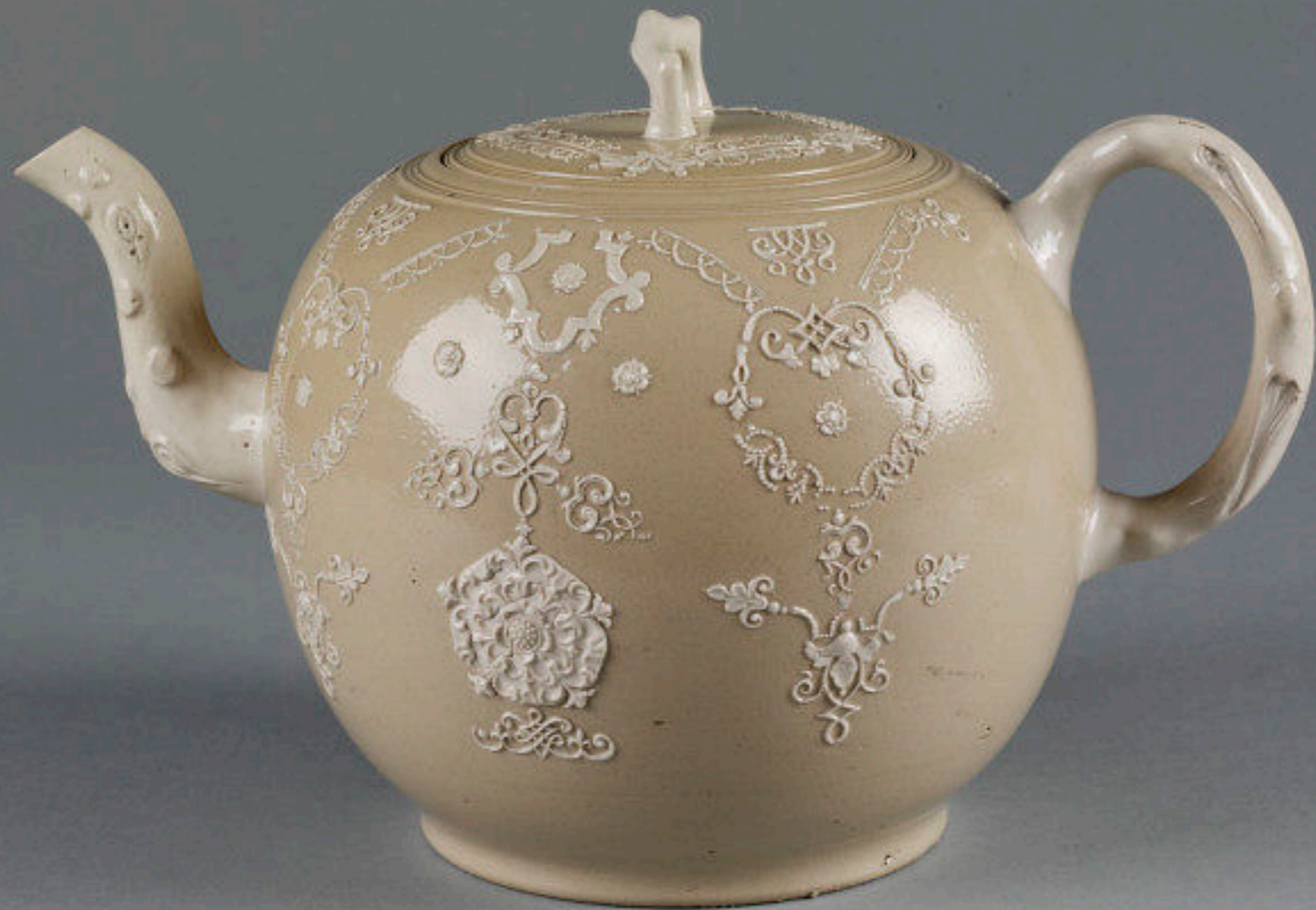
English Salt Glazed Stoneware Punch Pot from Staffordshire c. 1760 - 1770 (Victoria & Albert Museum)