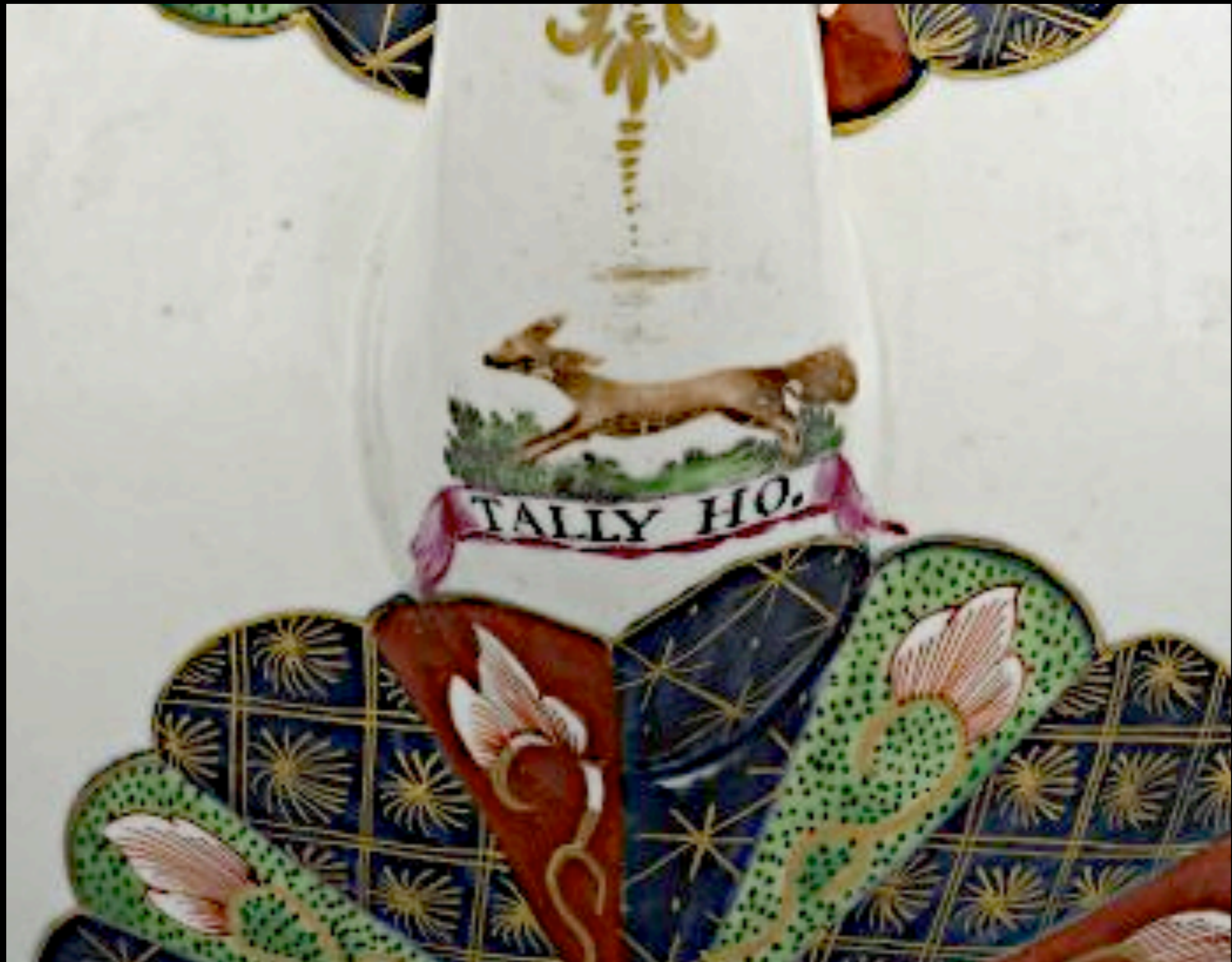
English Porcelain Punch Pot from Worcester Worcester Porcelain Factory c. 1775 (British Museum)