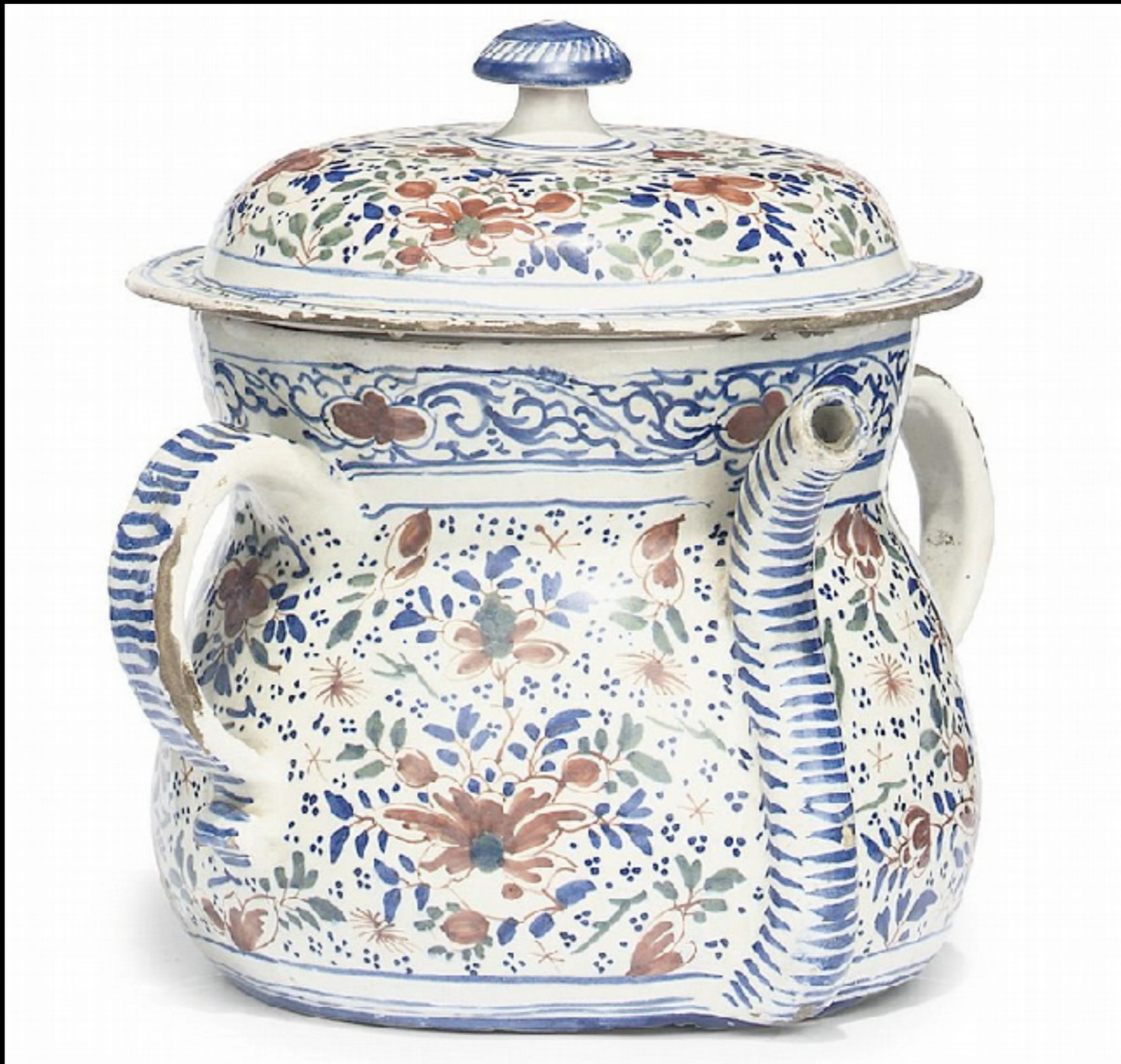
English Tin Glazed Posset Pot c. 1730 - 1740