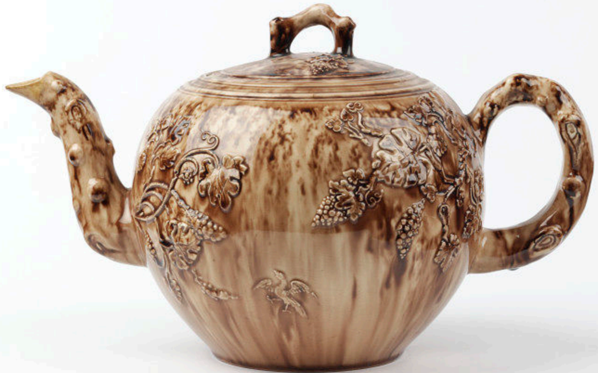
English Lead Glazed "Tortoiseshell" Punch Pot from Staffordshire