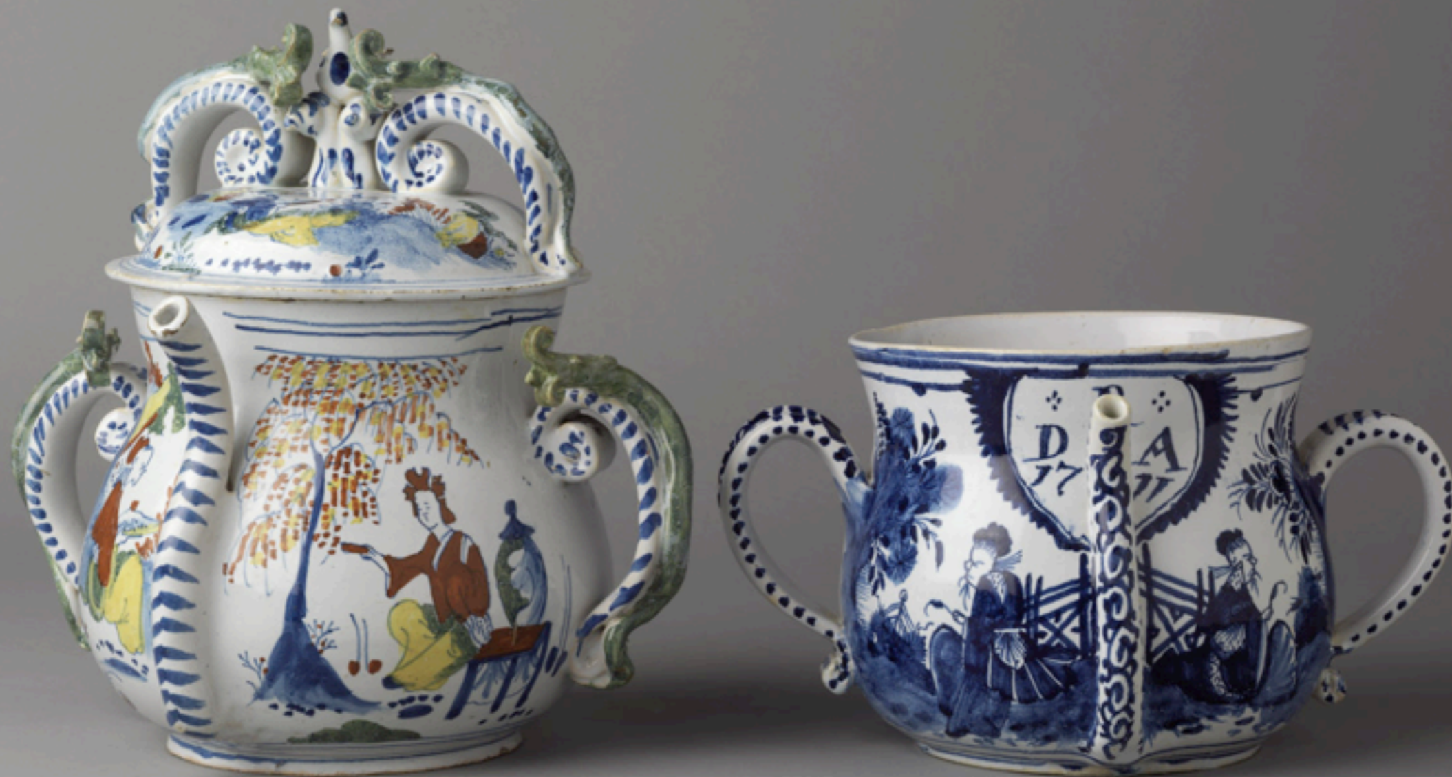
English Tin Glazed Earthenware Posset Pots from Bristol