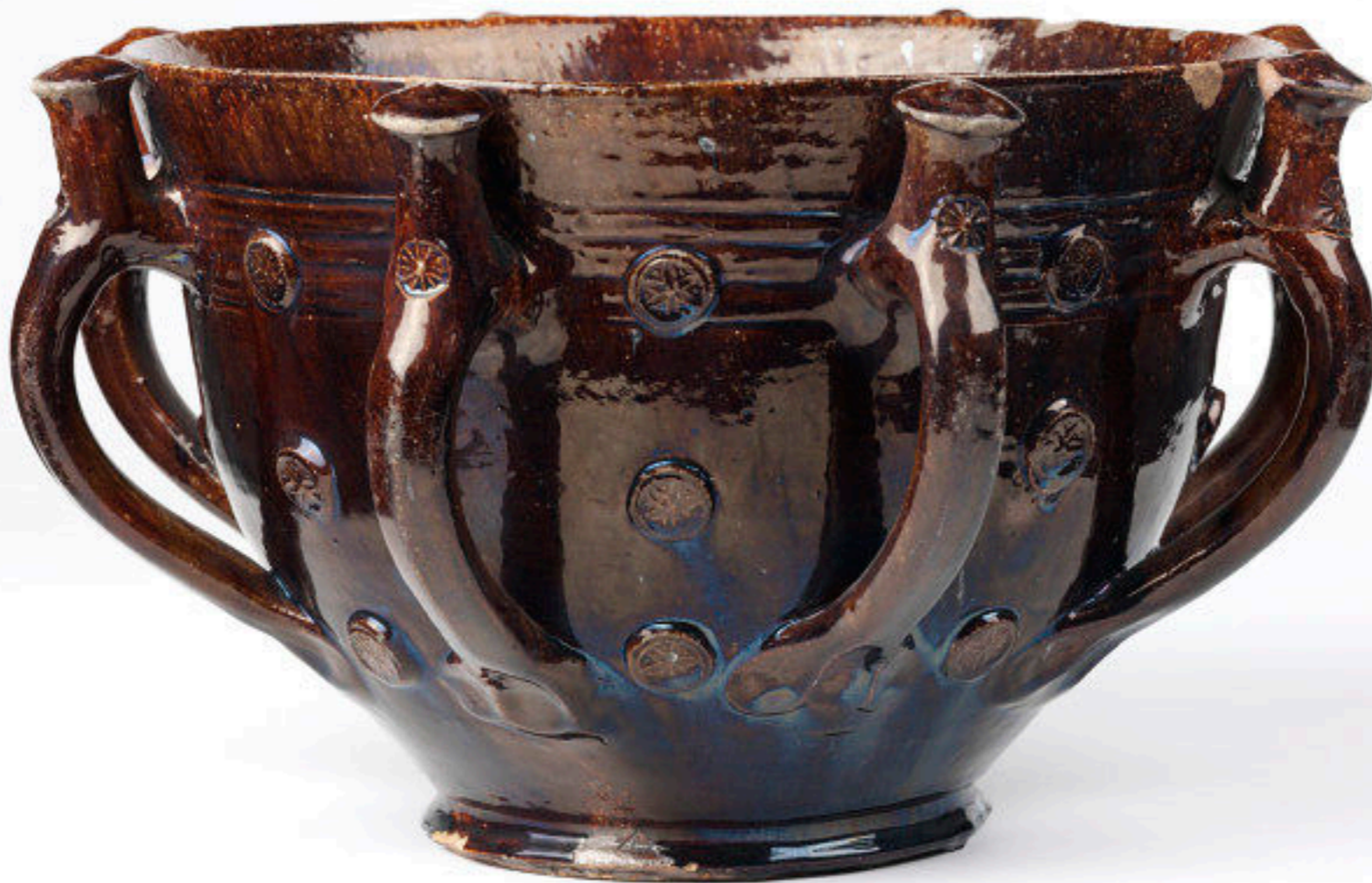
English Lead Glazed Earthenware Wassail Bowl from Wilshire Dated 14/12/1682