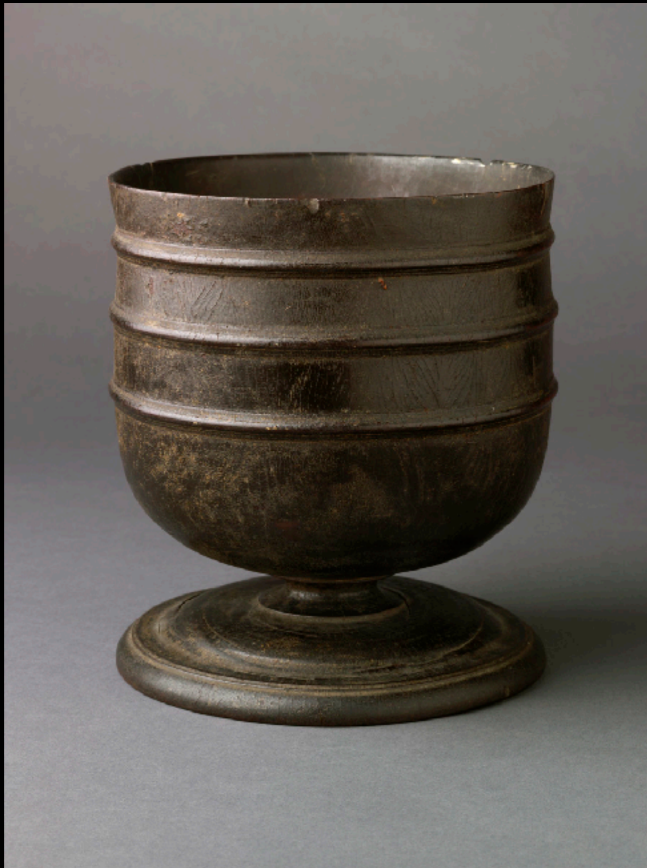
American Lignum Vitae Wassail Bowl from New Jersey