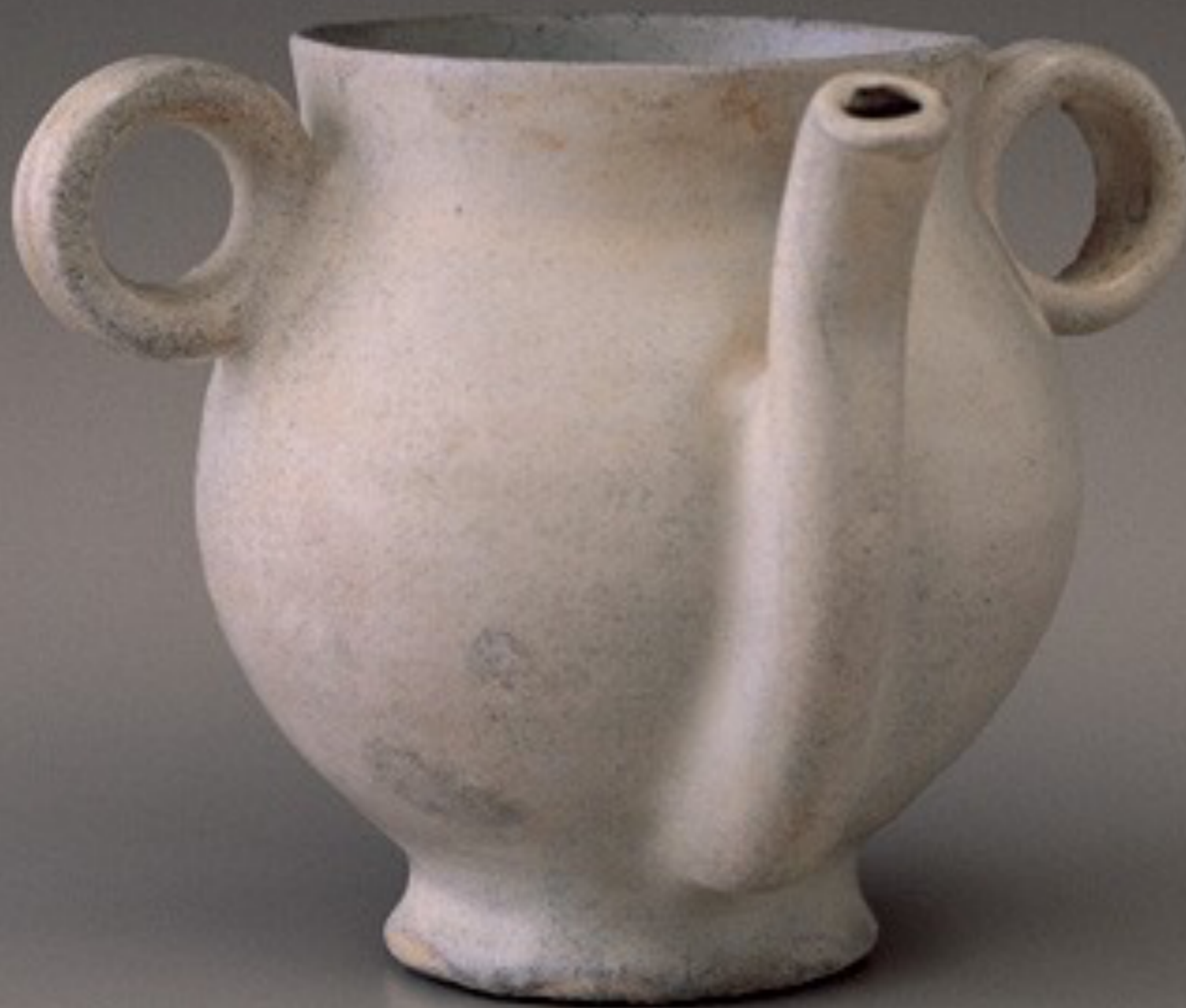
English Tin Glazed Earthenware Posset Pot from London c. 1650 - 1660 (Noël Hume Collection;)