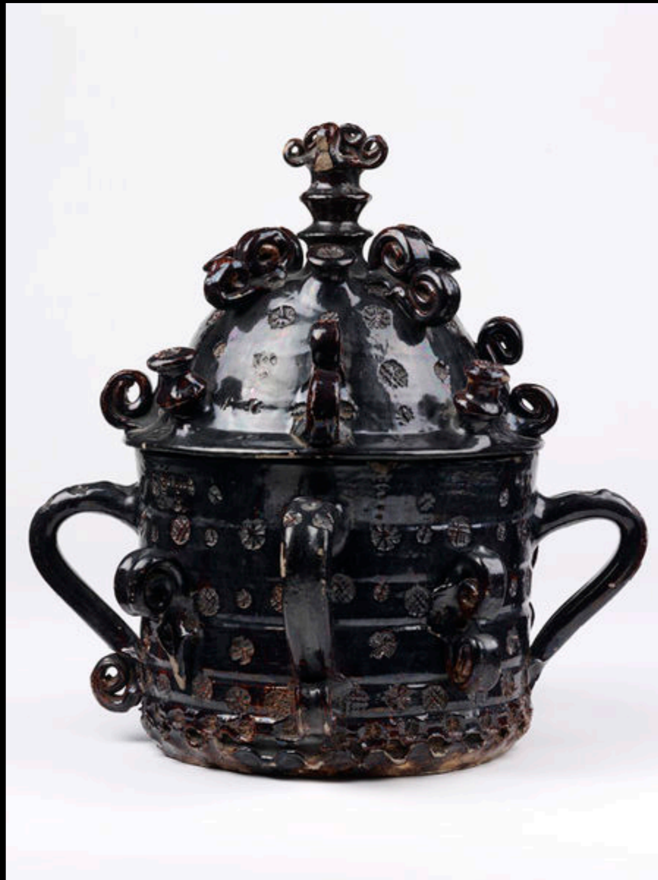
Lead Glazed Earthenware Wassail Bowl & Cover from Wiltshire Dated 1702 (Victoria & Albert)