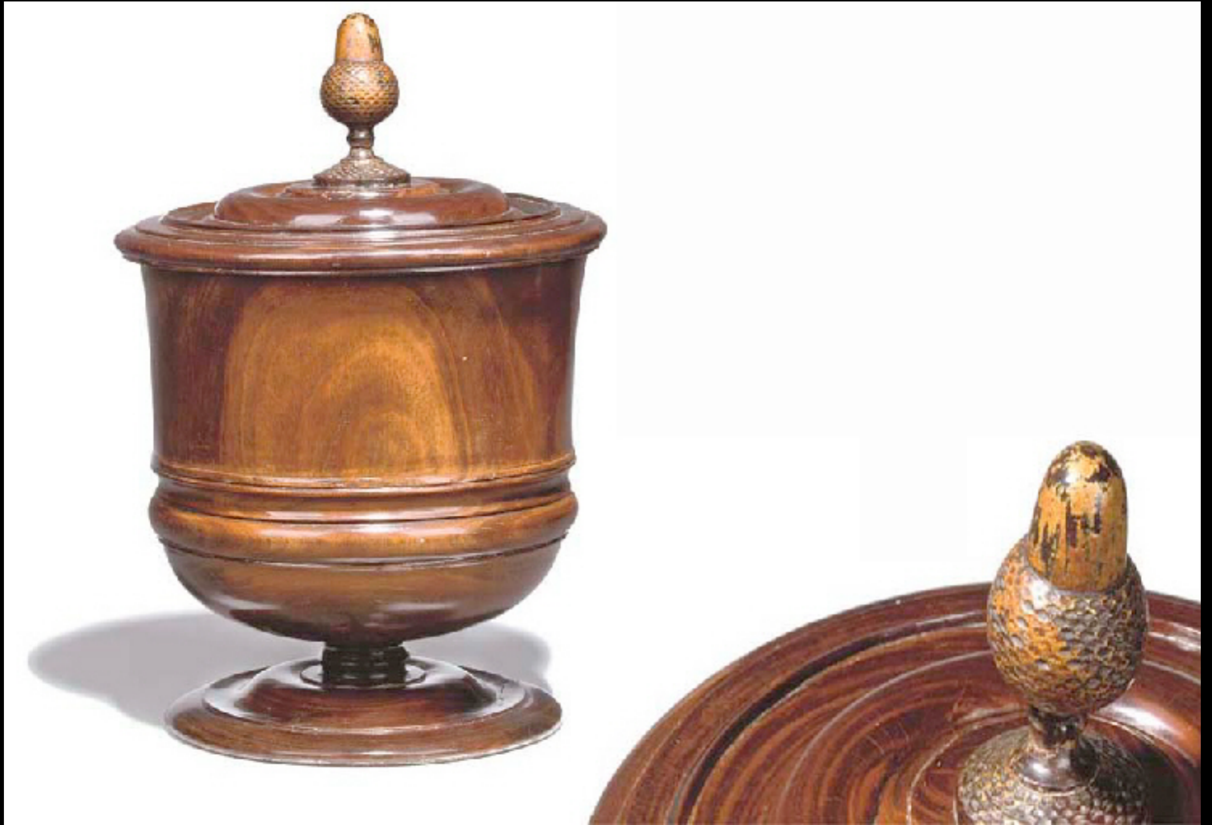
English Lignum Vitae Wassail Bowl and Cover c. 1680 (Christie's)