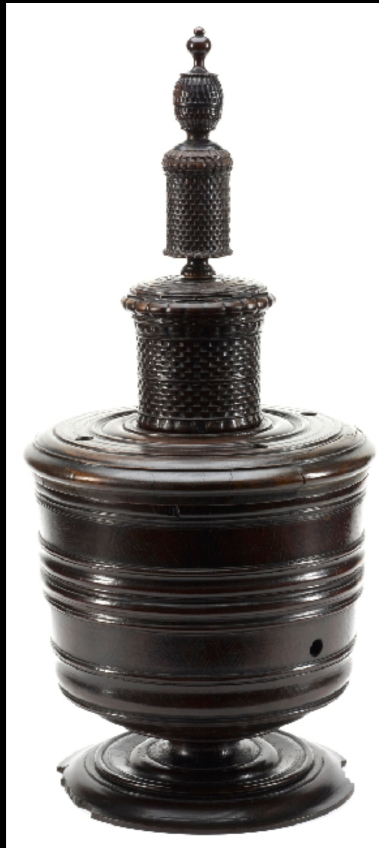
Lignum Vitae Wassail Bowl Owned by Arthur Chichester, Brought from Devon to Ulster in 1599 (Ulster Museum, Botanic Gardens, Belfast)