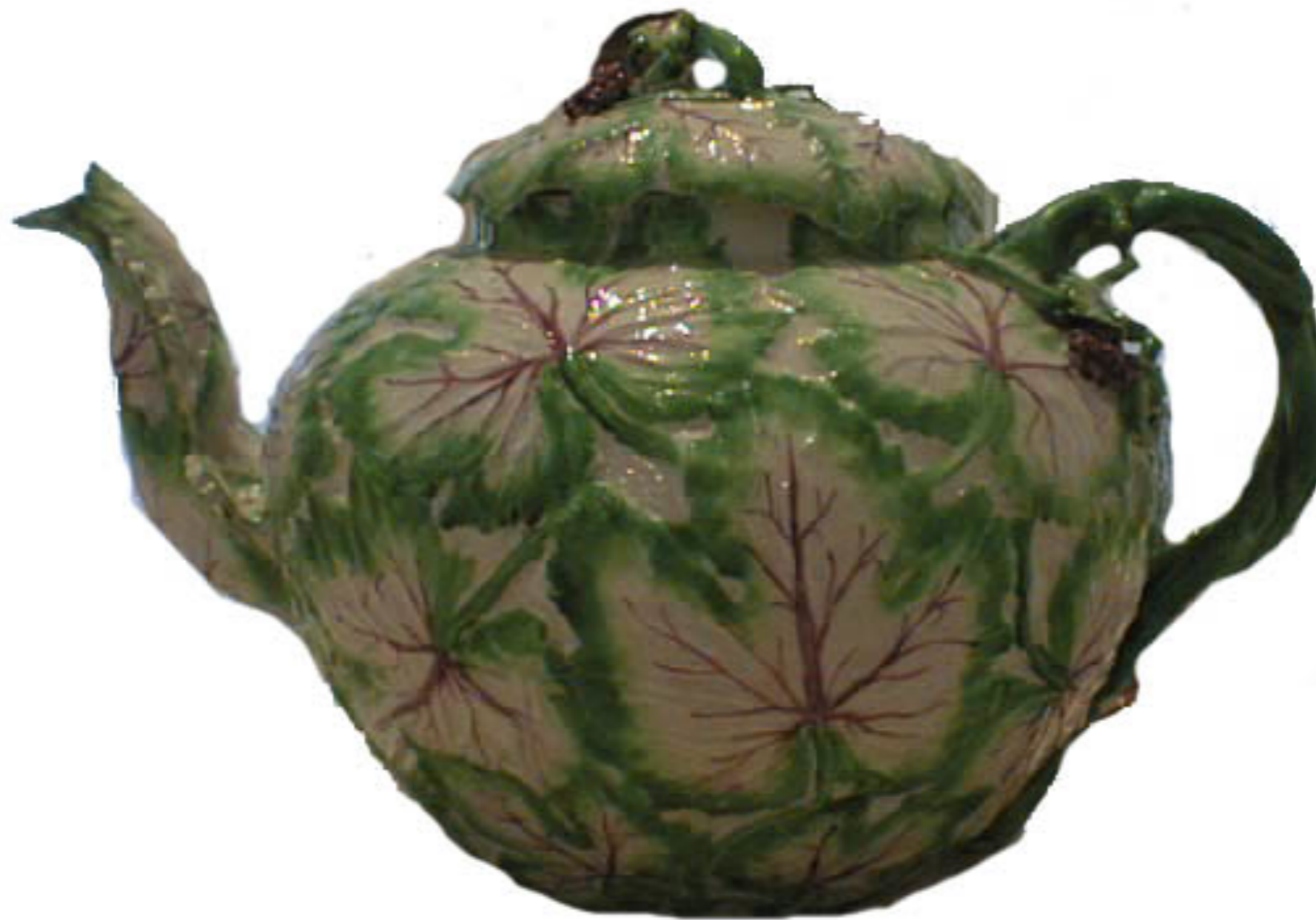
English Staffordshire Punch Pot