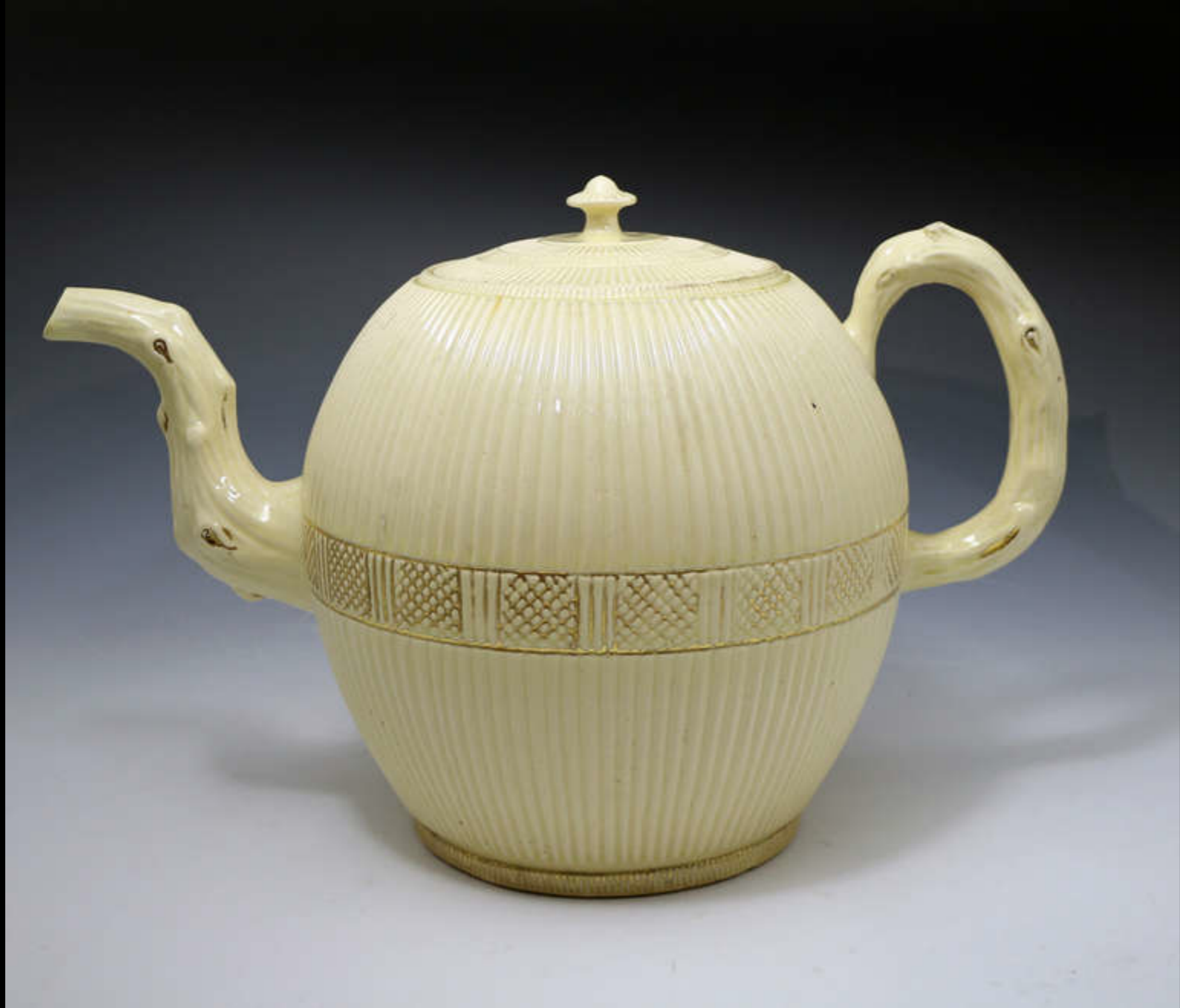
English Lead Glazed Earthenware / Creamware Punch Pot