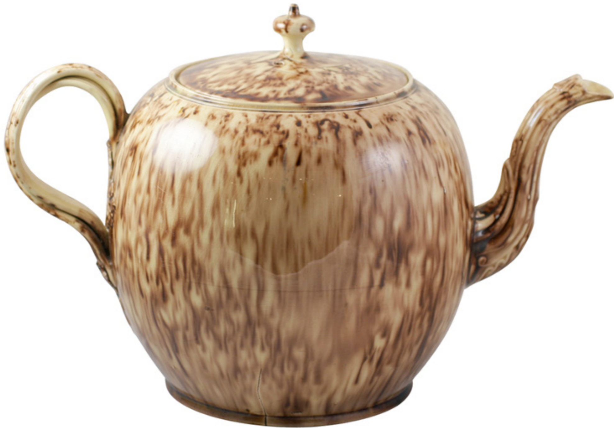
English Lead Glazed "Tortoiseshell" Punch Pot from Staffordshire c. 1760 (Leo Kaplan Ltd. Antiques)