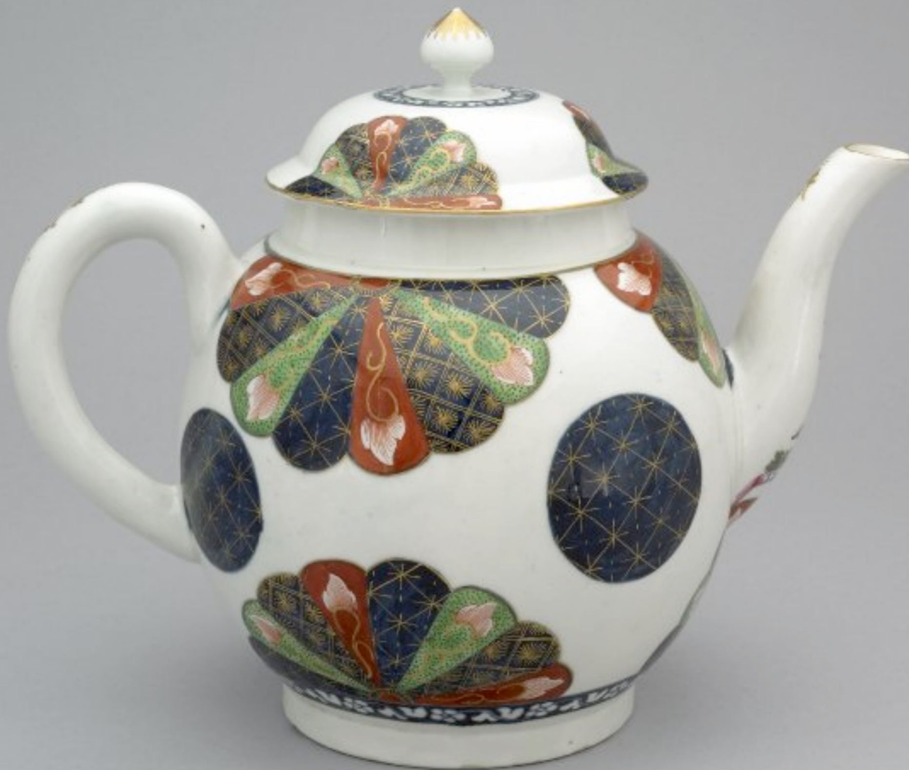
English Porcelain Punch Pot from Worcester Worcester Porcelain Factory c. 1775 (British Museum)