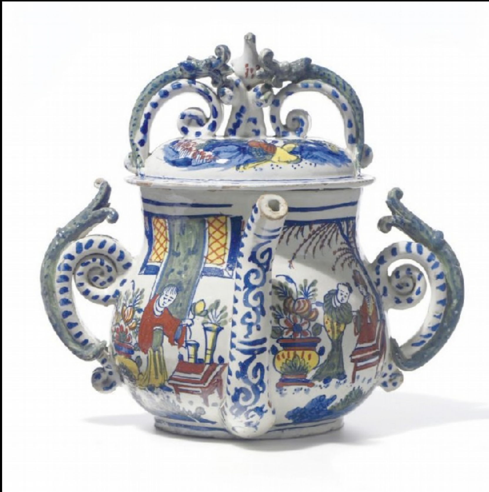
English Tin Glazed Polychrome Earthenware Posset Pot c. 1770 (Sotheby's Auction House)