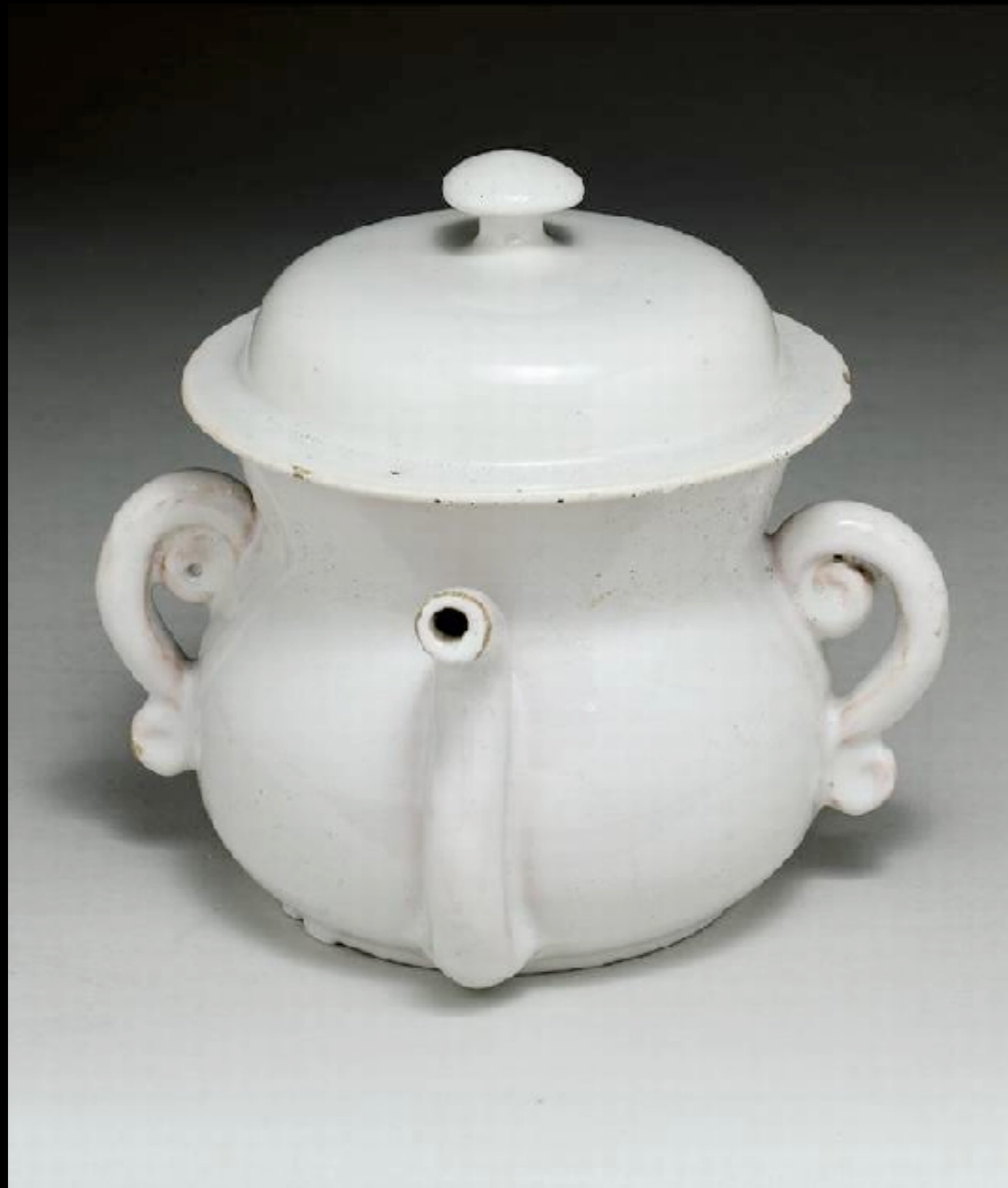
English Tin Glazed Earthenware Posset Pot c. 1700 (Sotheby's Auction House)