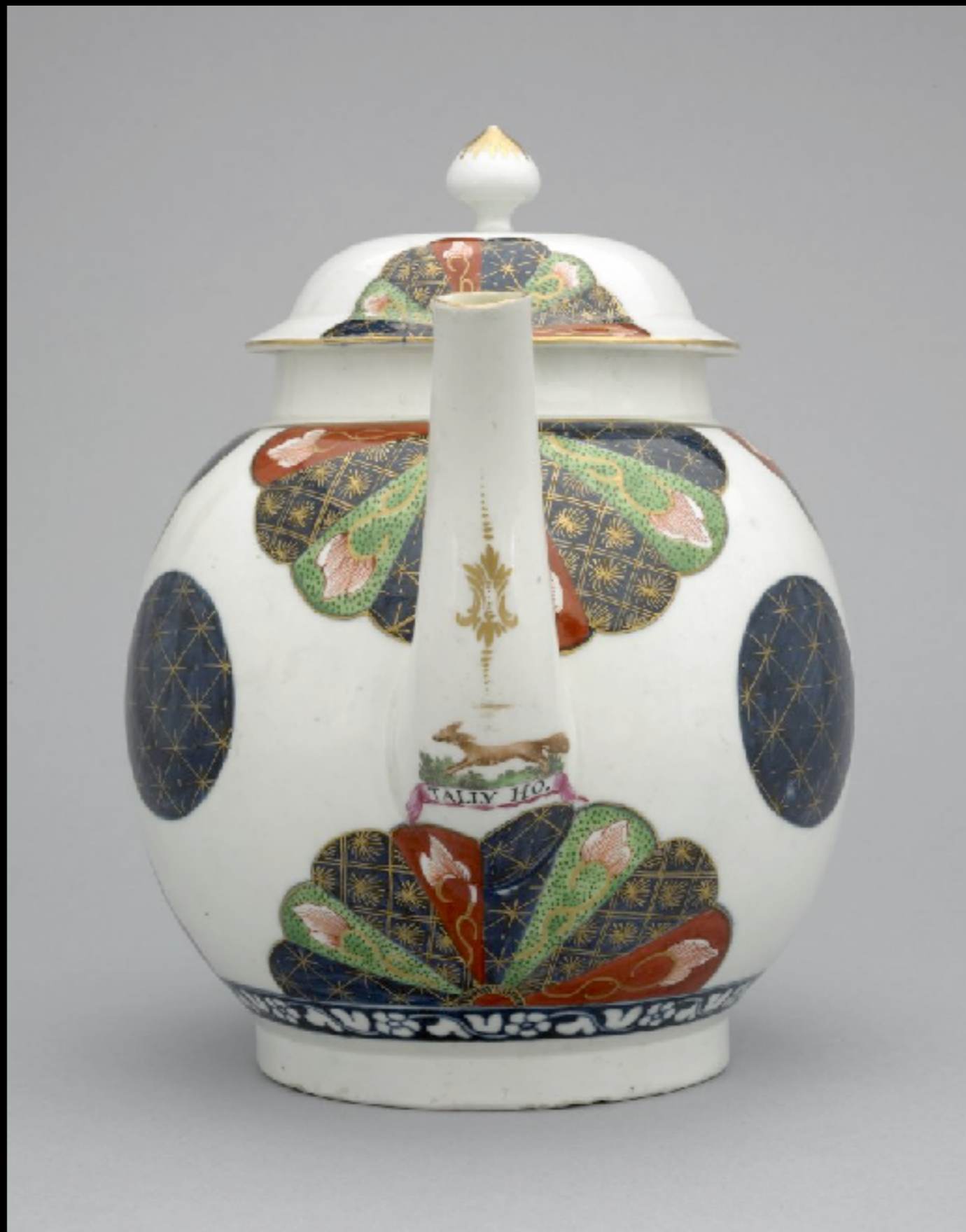
English Porcelain Punch Pot from Worcester Worcester Porcelain Factory c. 1775 (British Museum)