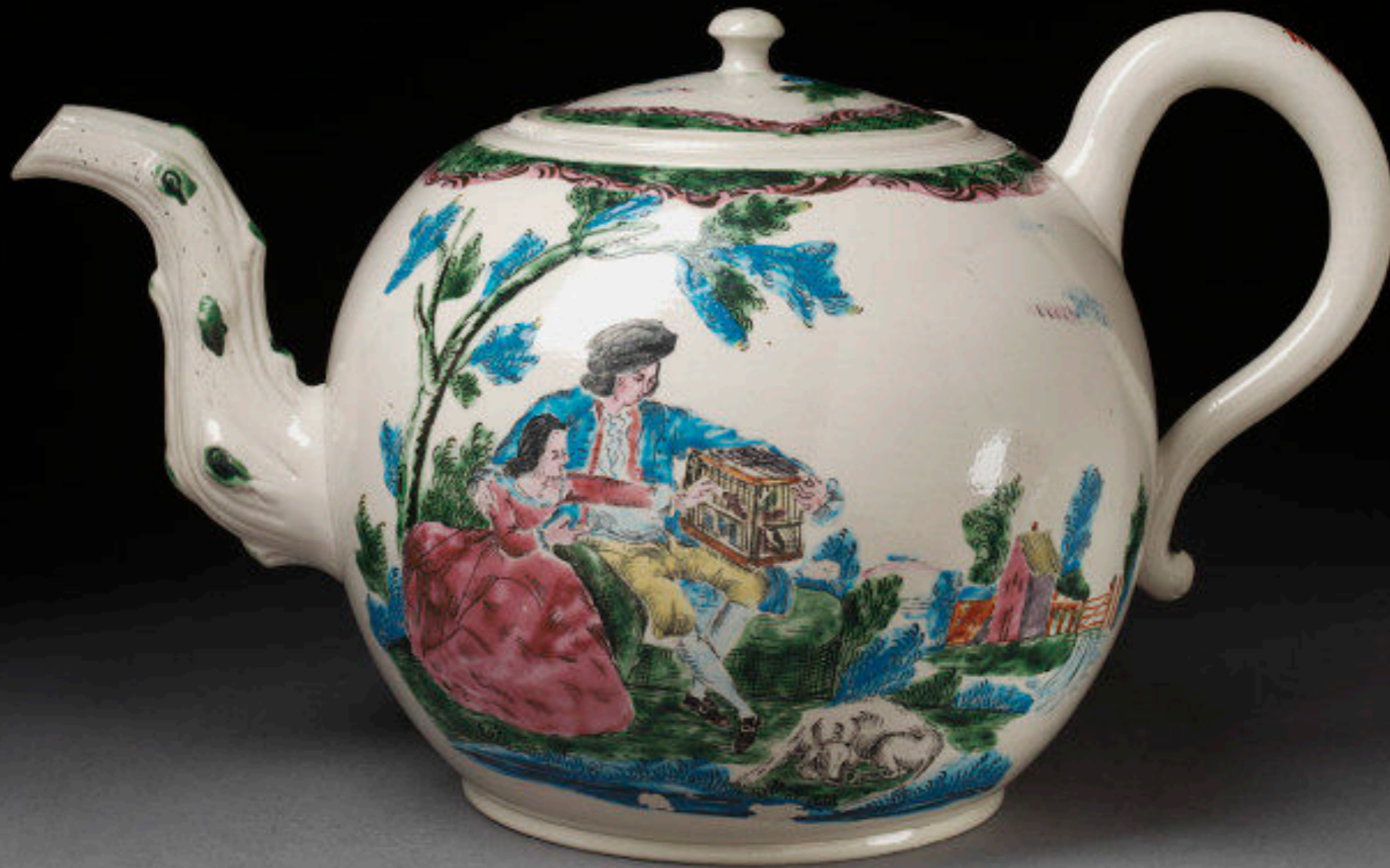
English Salt Glazed Stoneware Punch Pot from Staffordshire c. 1765 (Victoria & Albert Museum)