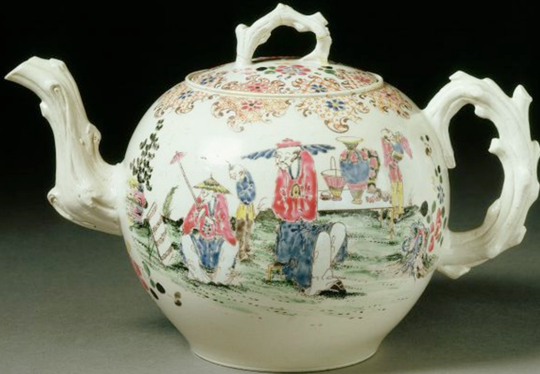
English Salt Glazed Stoneware Punch Pot from Staffordshire c. 1755 - 1760 (Victoria & Albert Museum)