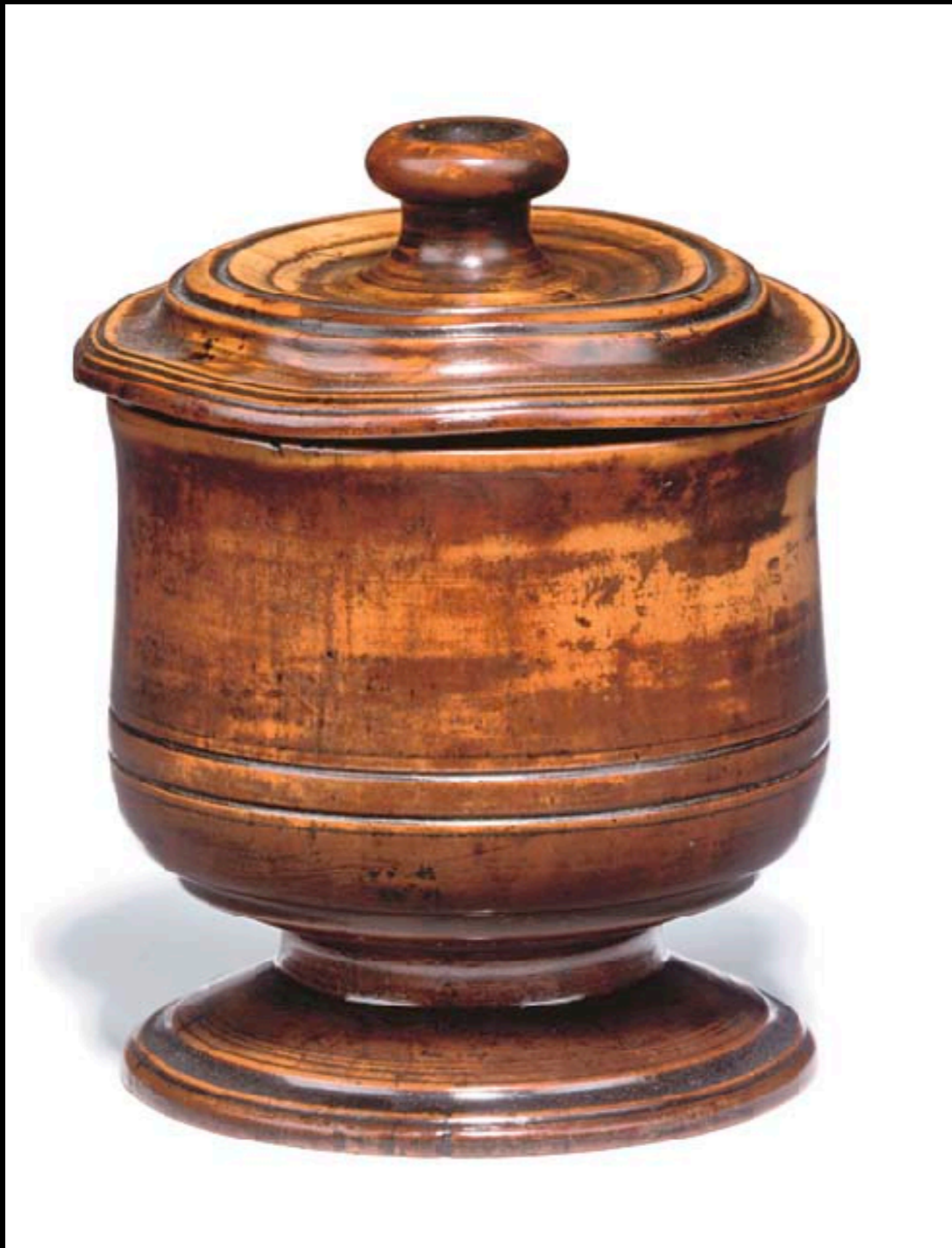
English Sycamore Posset Cup and Cover c. 1680 (Christie's Auction House)