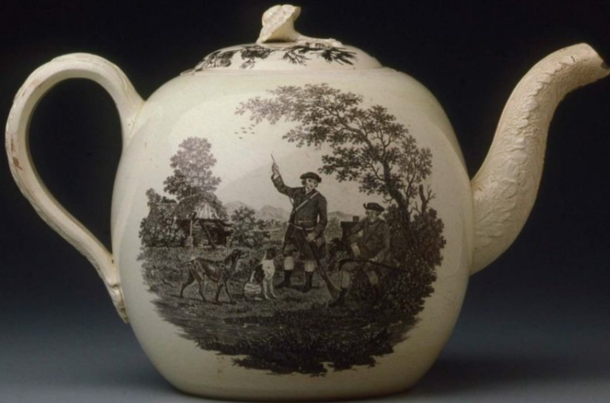
English Lead Glazed Earthenware "Creamware" Punch Pot with Transfer by Josiah Wedgwood, Design by George Stubbs c. 1780 (Museum of Fine Arts, Boston)