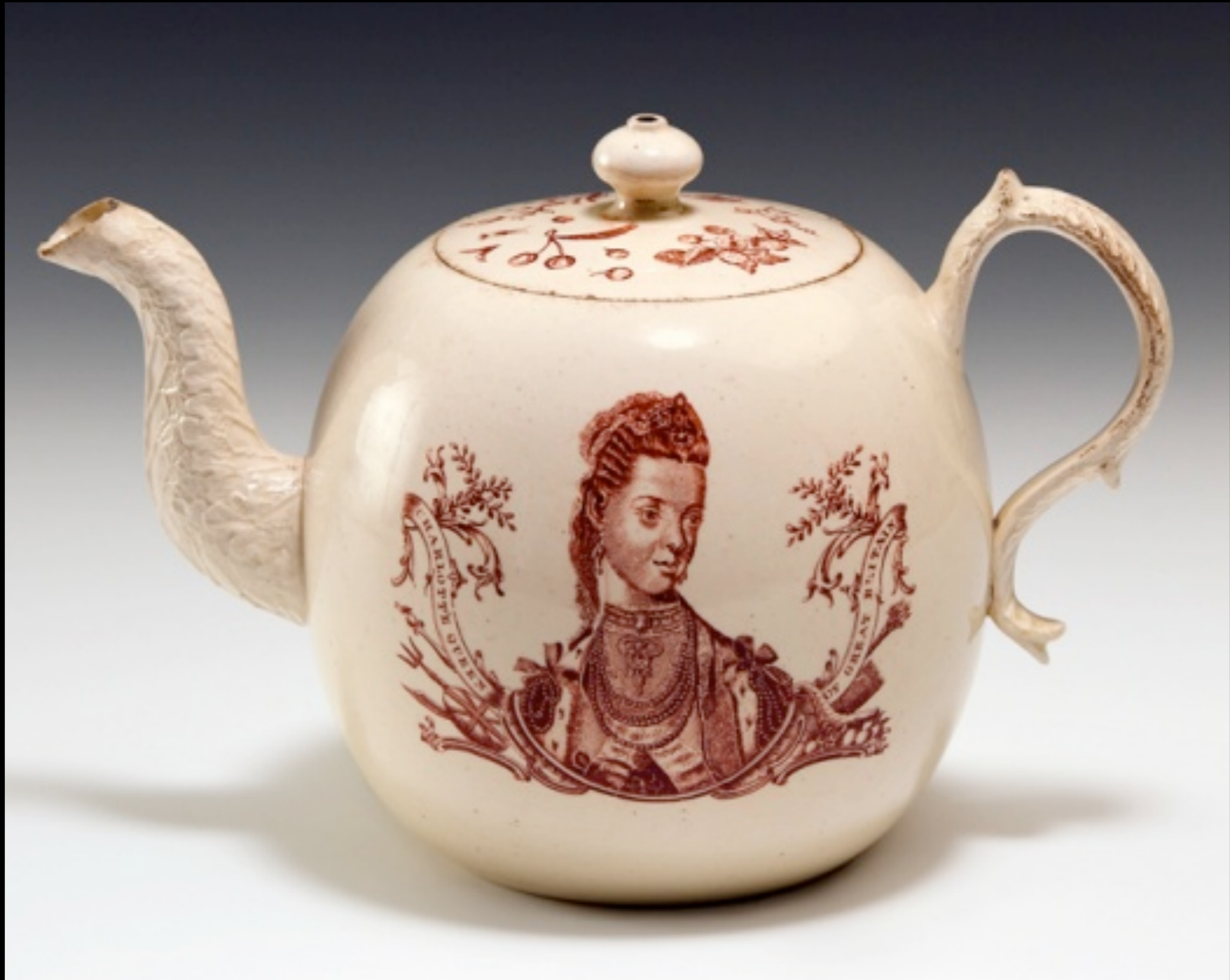
English Lead Glazed Earthenware Punch Pot from Staffordshire