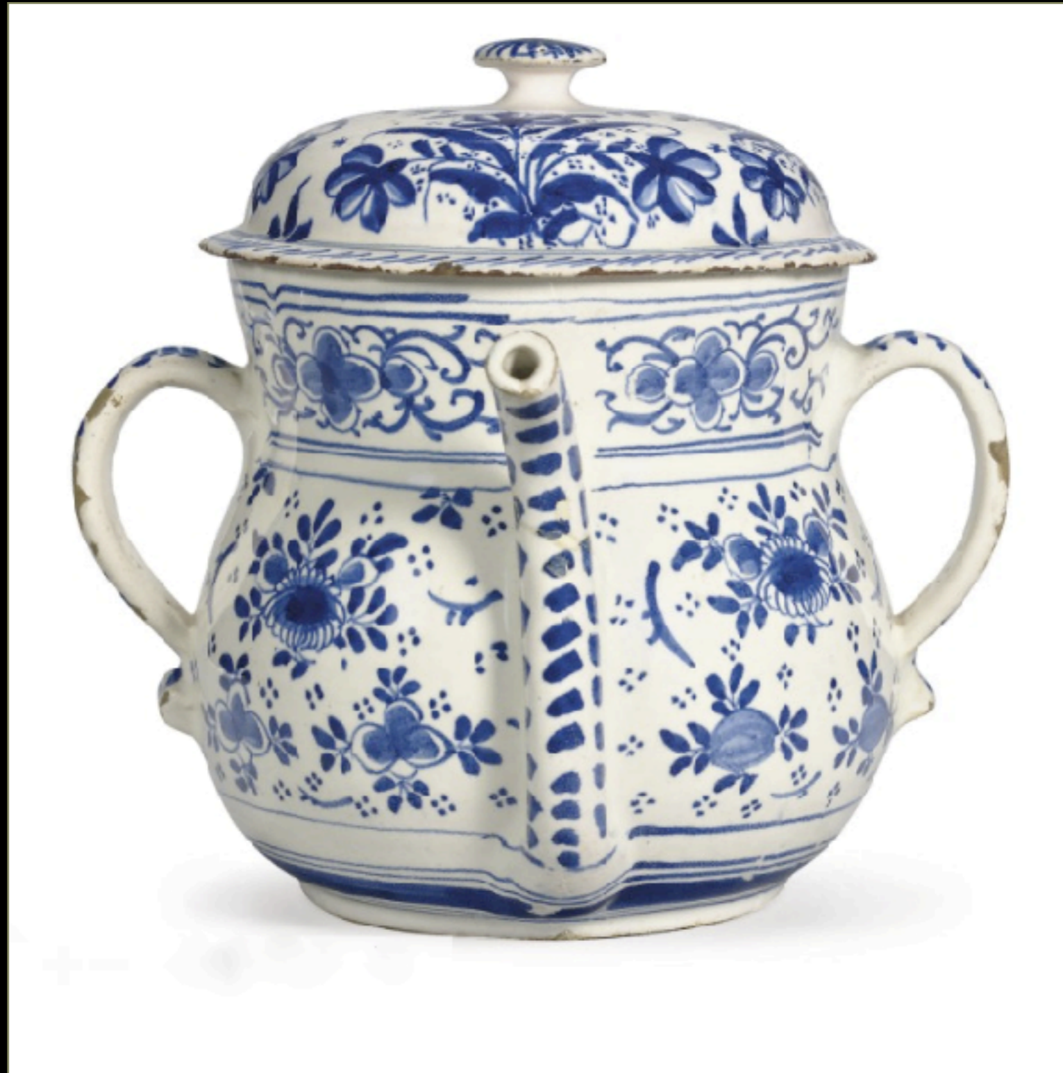
English Tin Glazed Earthenware Posset Pot from Bristol c. 1715 (Christie's Auction House)