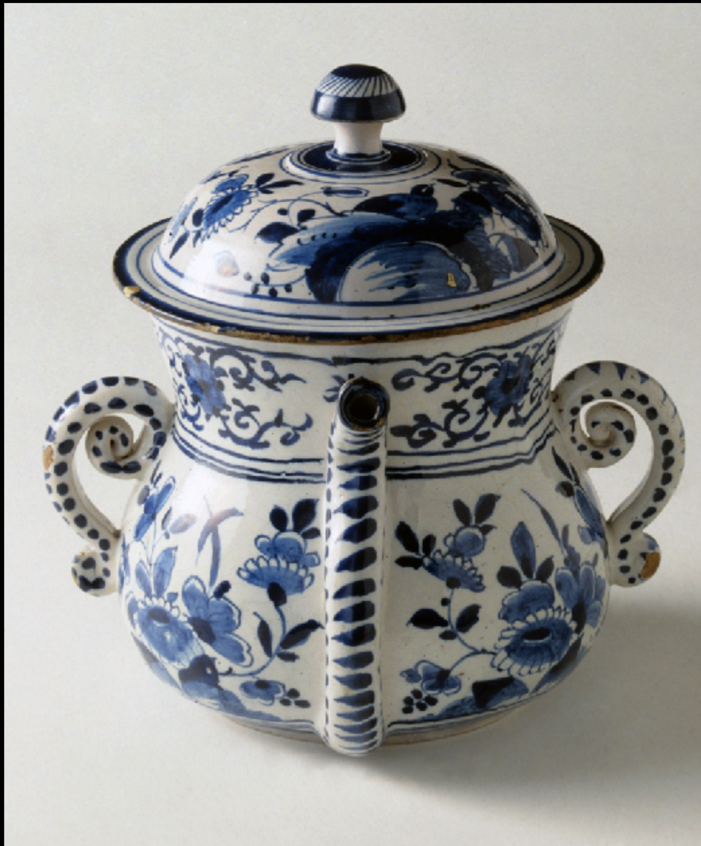
English Tin Glazed Earthenware Posset Pot from Lambeth c. 1660 - 1680 (Winterthur)