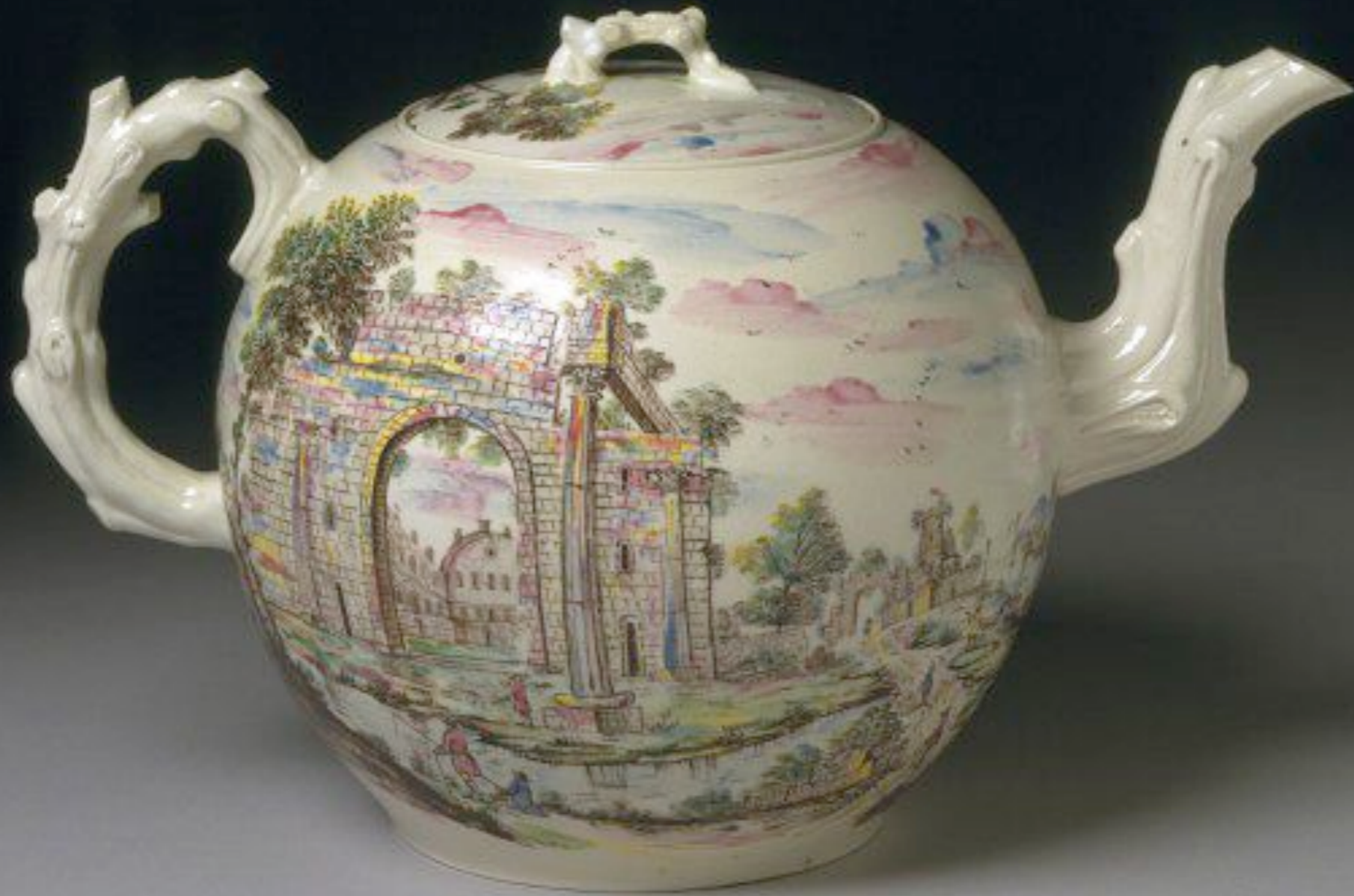
English Salt Glazed Stoneware Punch Pot from Staffordshire c. 1760 (Victoria & Albert Museum)