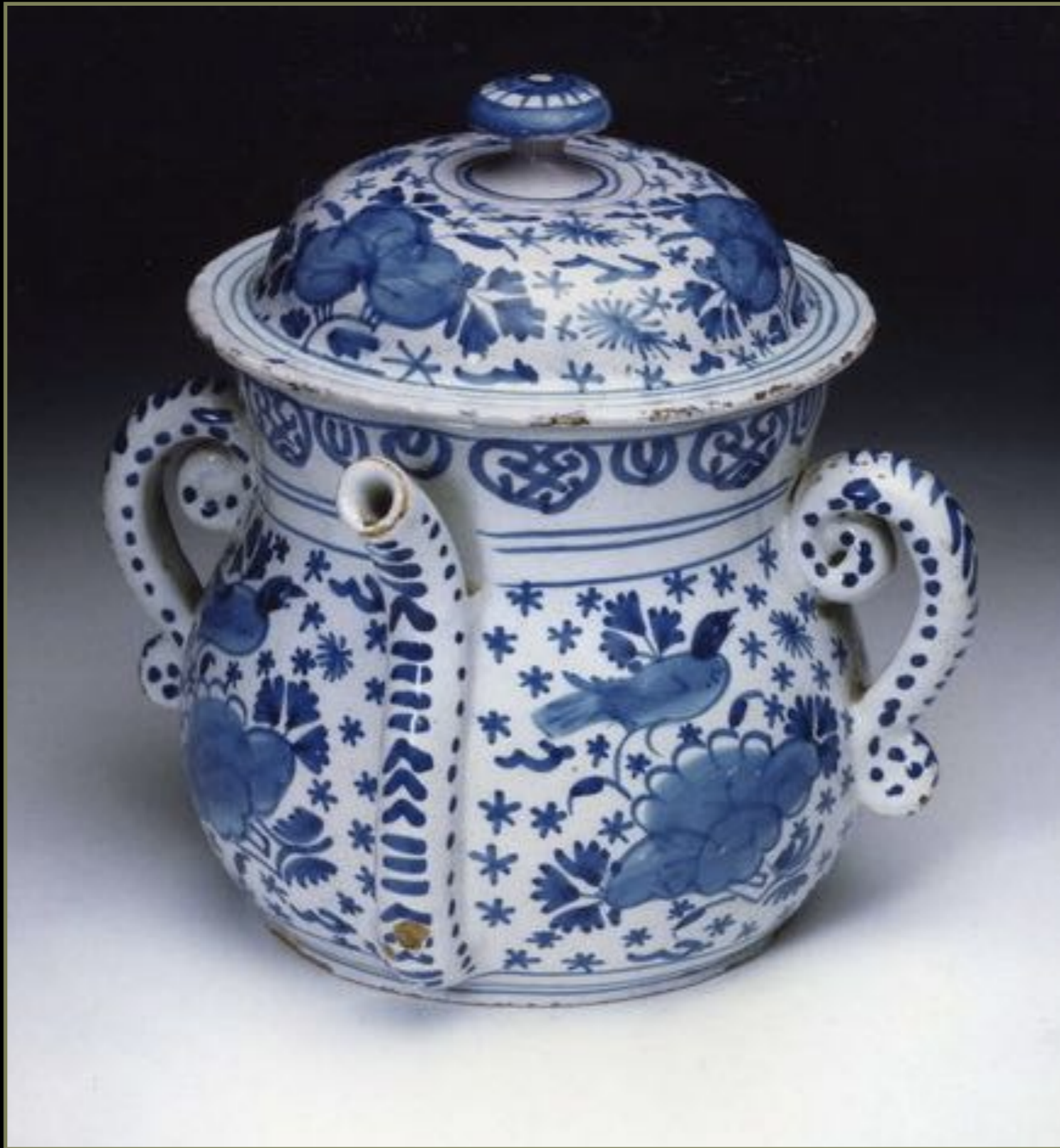
English Tin Glazed Earthenware Posset Pot Mid 18th Century (Colonial Williamsburg)