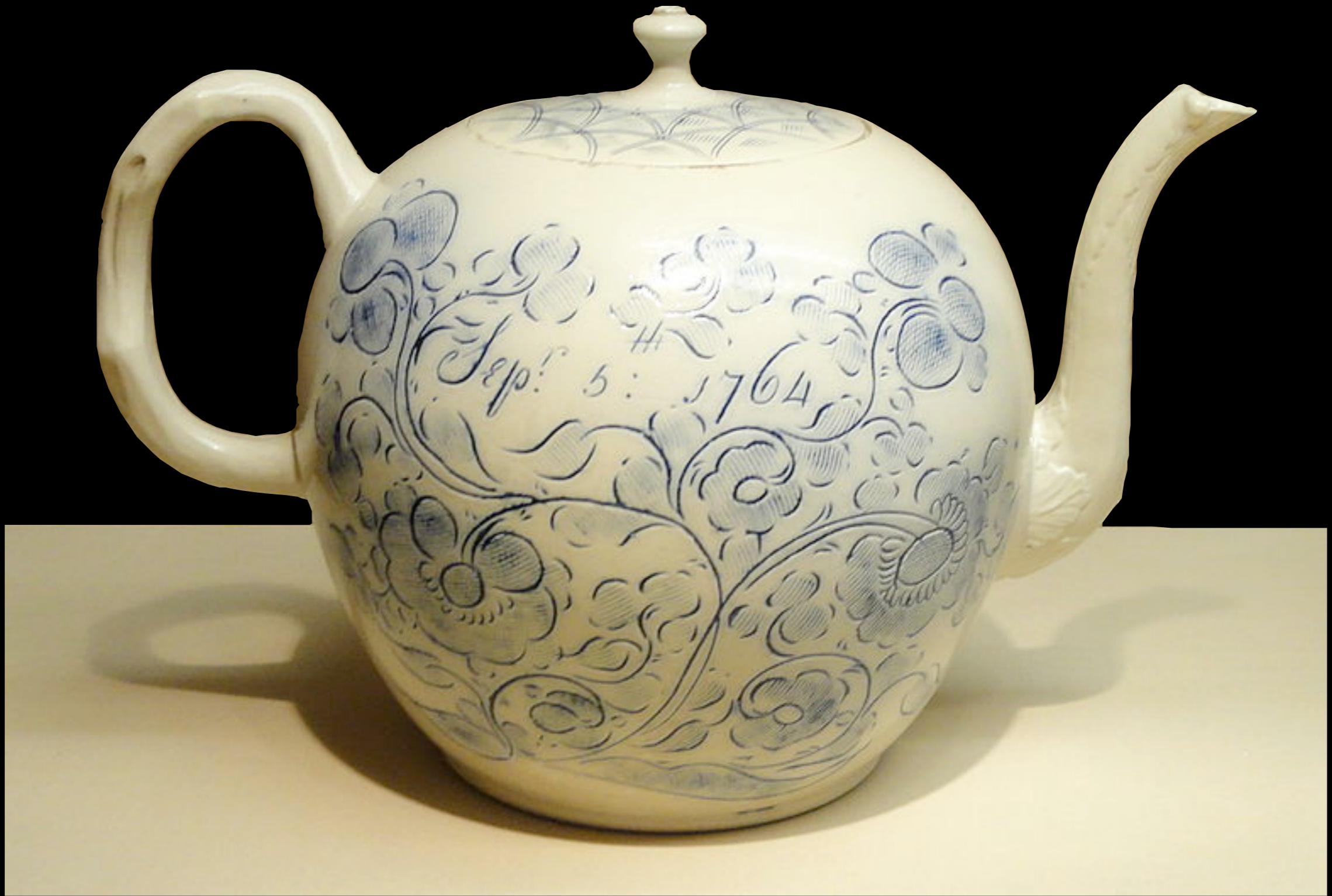
English "Scratch Blue" Stoneware Punch Pot Dated Sept. 5th 1764 (Nelson-Atkins Museum of Art)