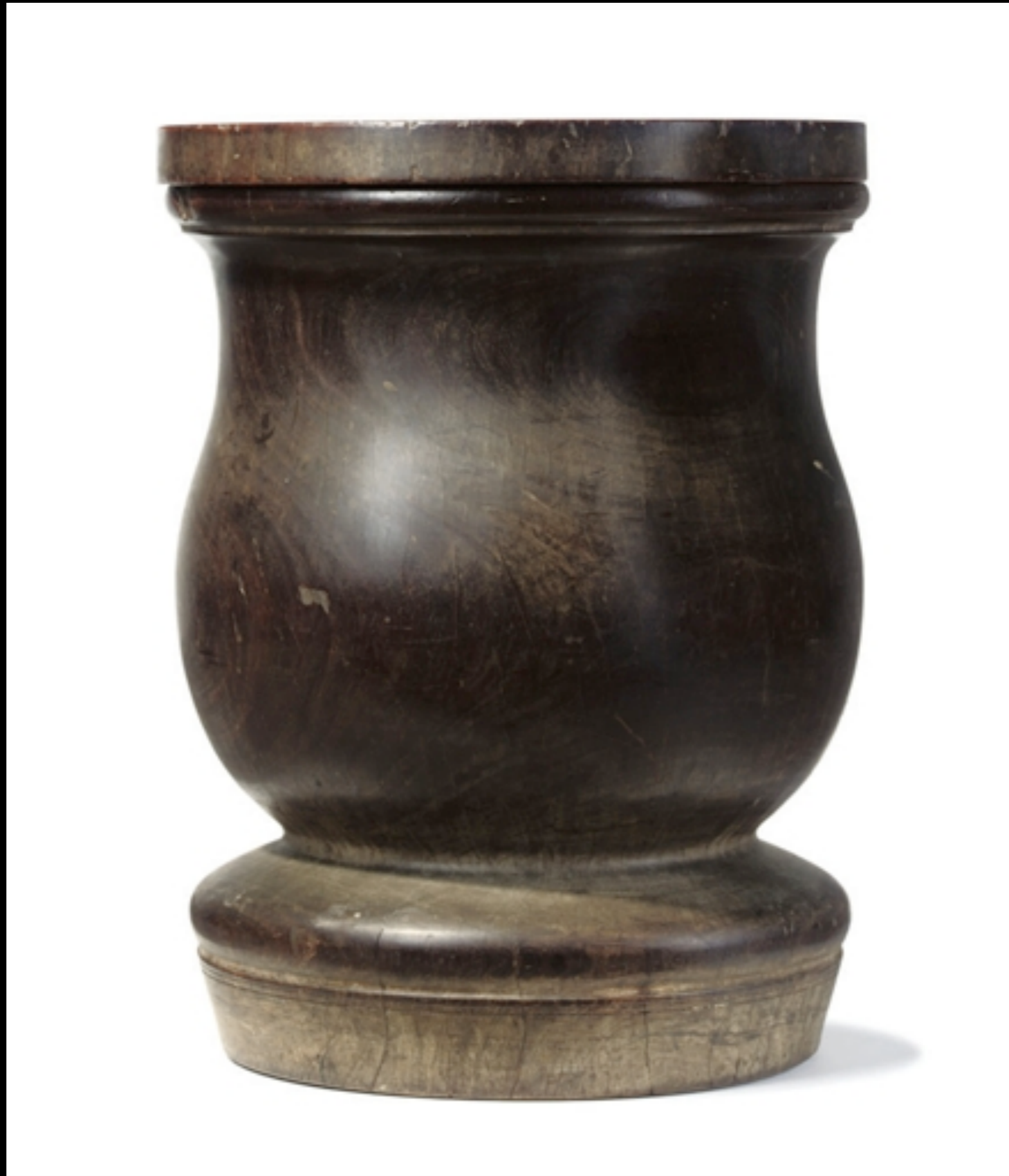
English Lignum Vitae Wassail Bowl & Cover Early 18th Century (Christie's)