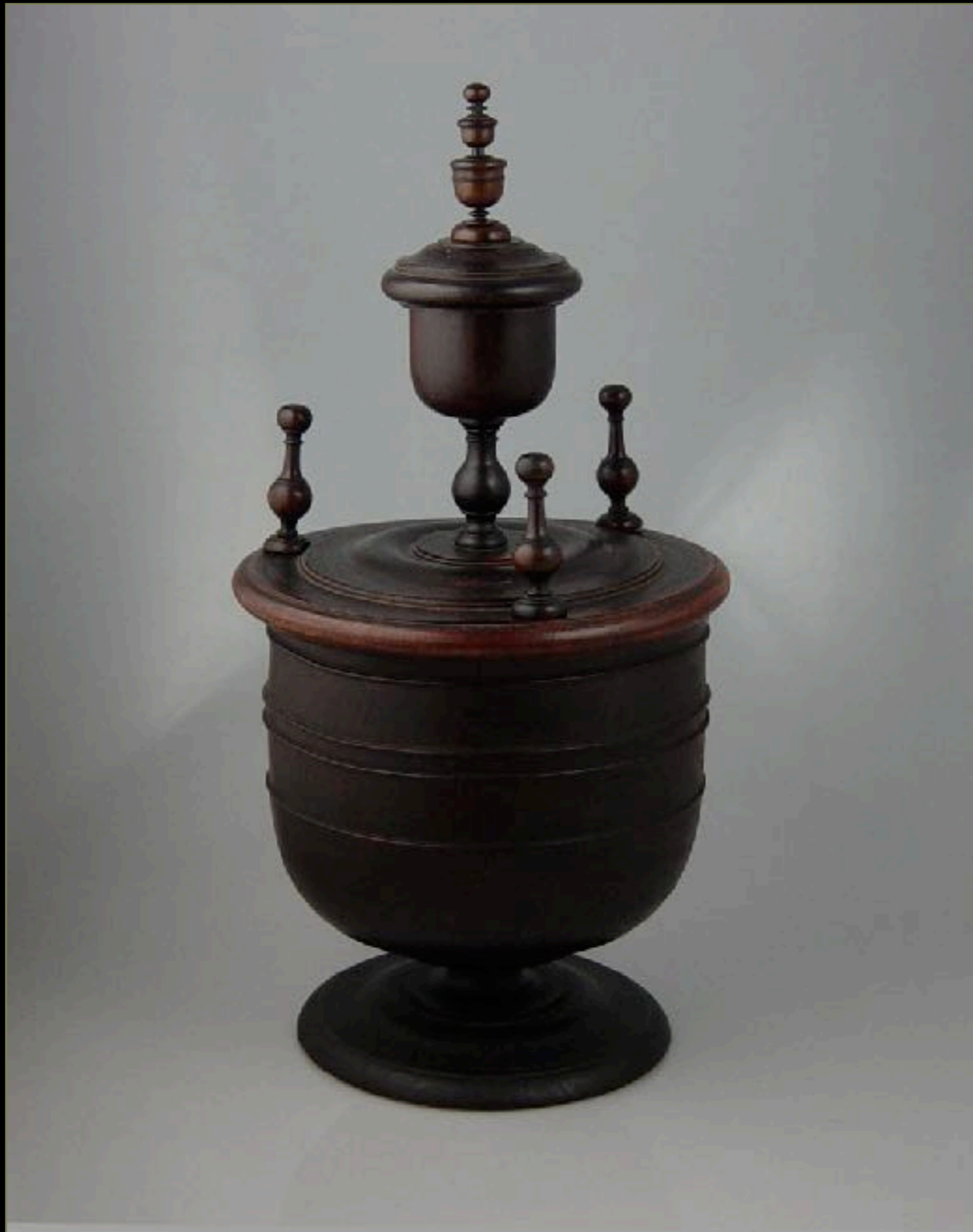
Lignum Vitae Wassail Bowl Dated 1685