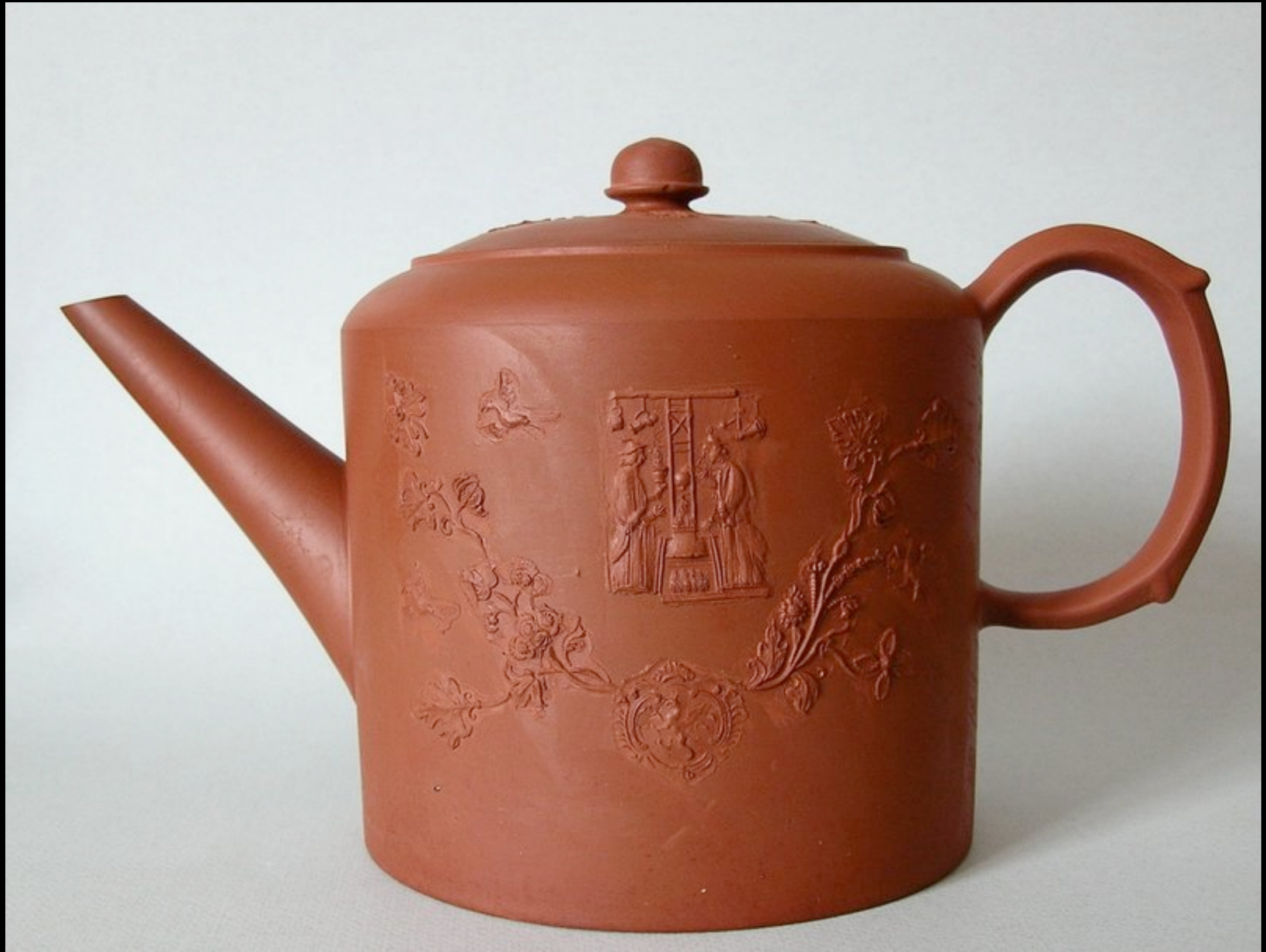
English Red Stoneware "Chinoiserie" Punch Pot from Staffordshire c. 1765 (East West Gallery)