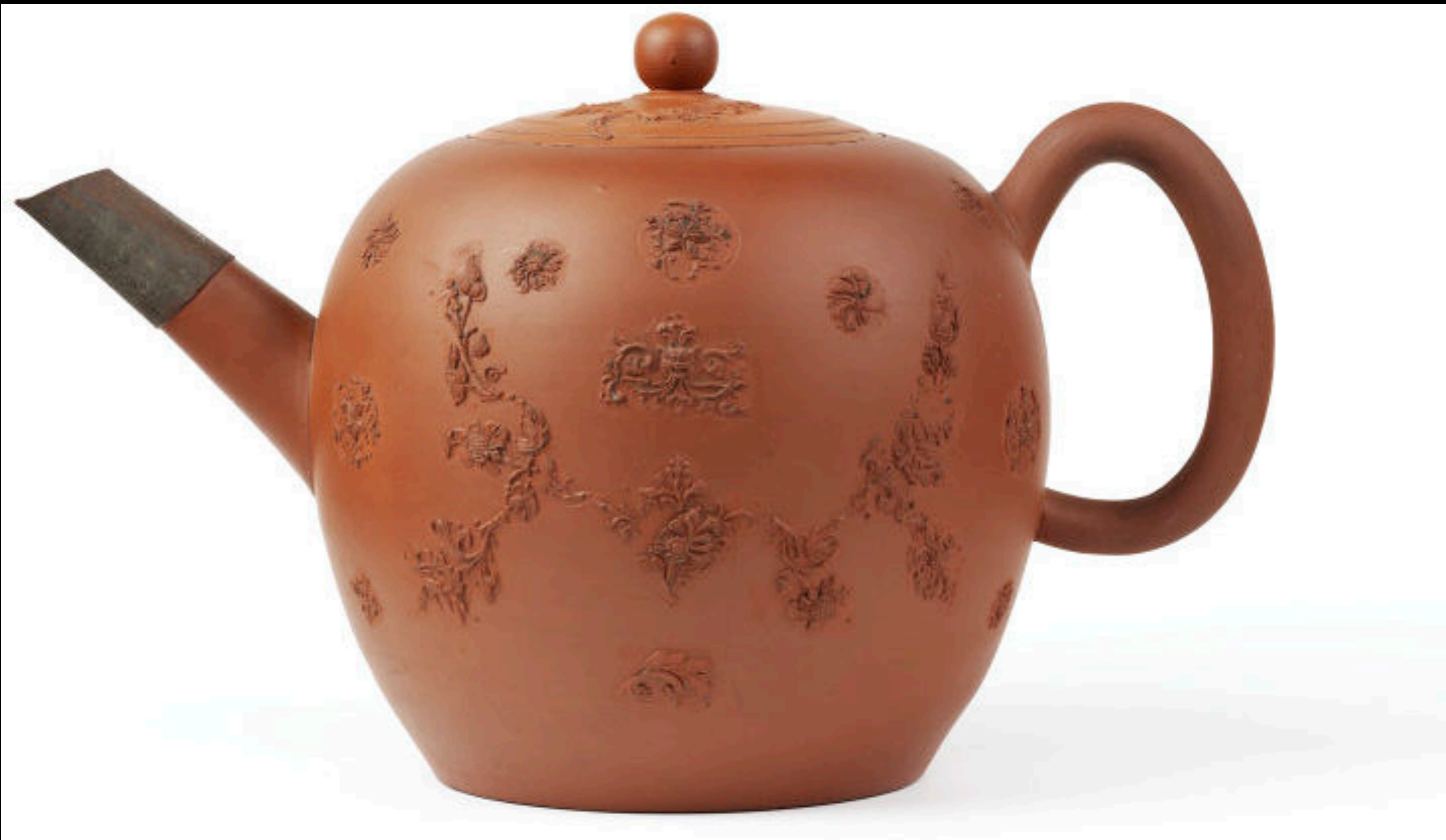
English Red Stoneware Punch Pot from Fenton by Thomas Whieldon c. 1760 - 1770 (Victoria & Albert Museum)