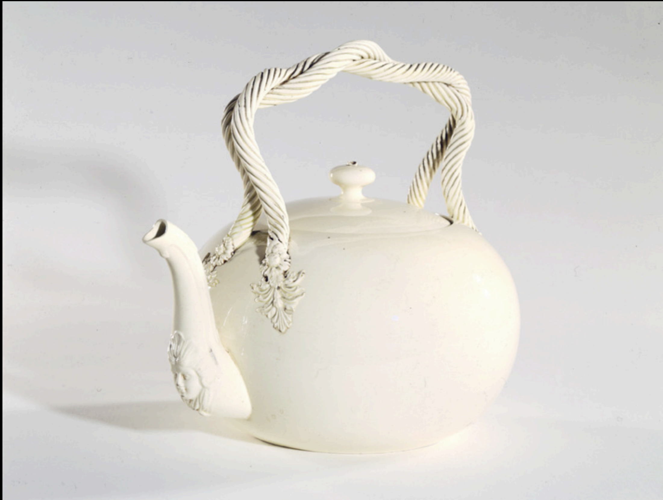
English Lead Glazed / Creamware Punch Pot c. 1765 - 1780 (Historic New England)