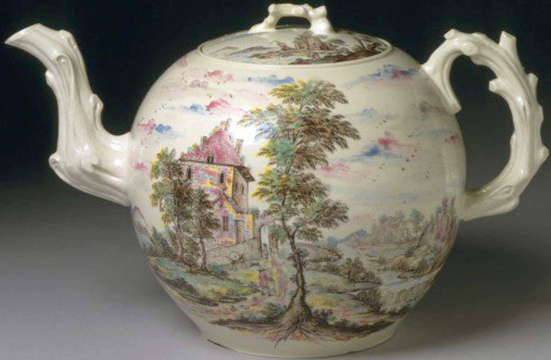
English Salt Glazed Stoneware Punch Pot from Staffordshire c. 1760 (Victoria & Albert Museum)