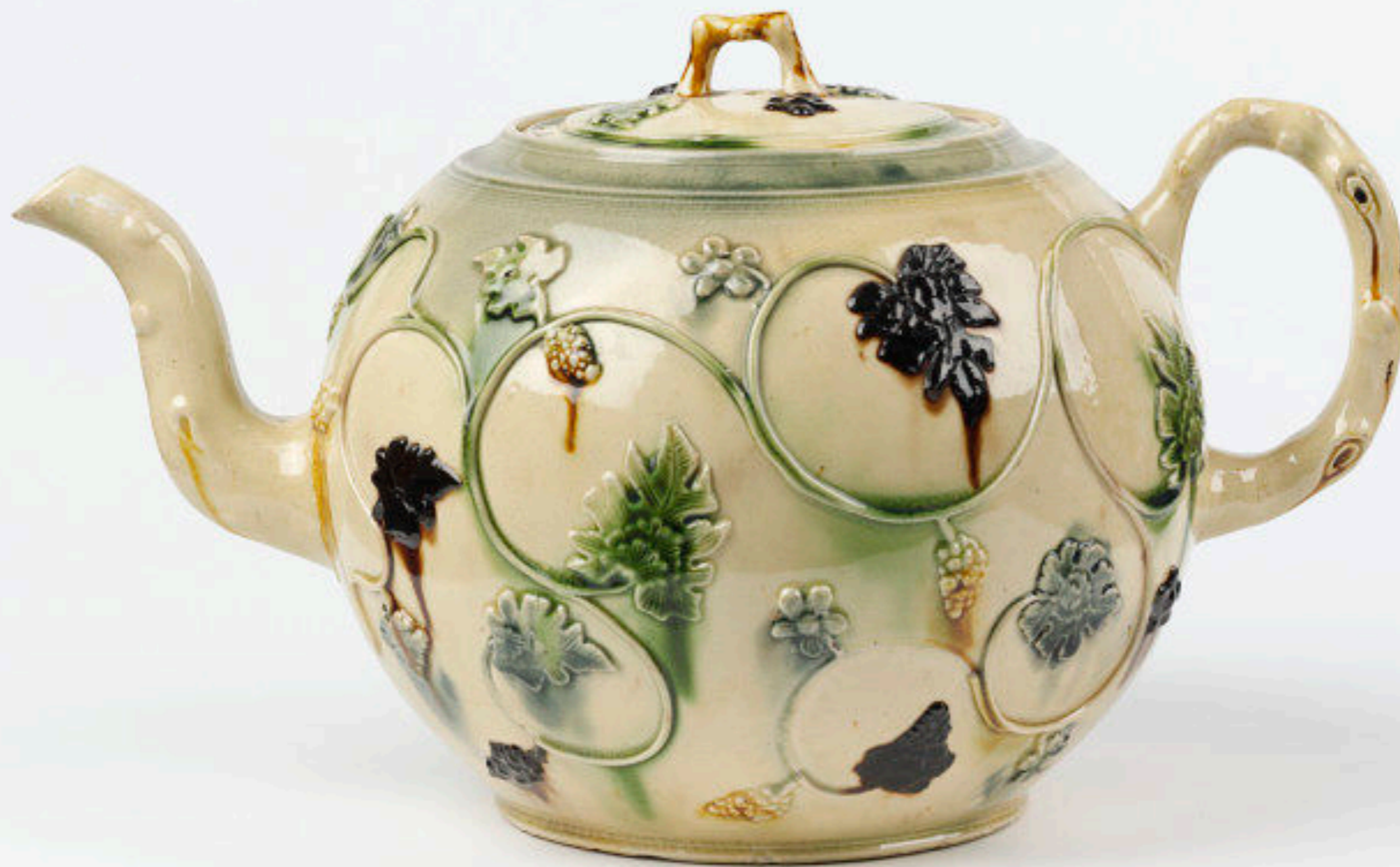
English Lead Glazed Earthenware Punch Pot from Staffordshire c. 1750 (Victoria & Albert Museum)