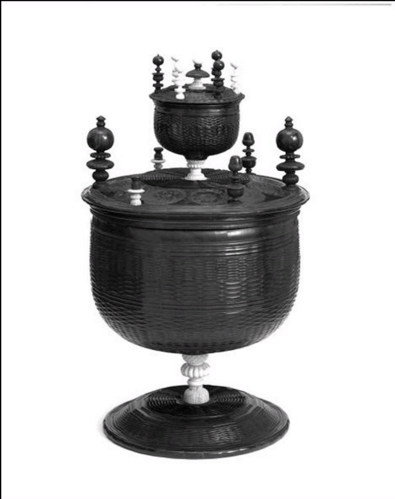
Lignum Vitae Wassail Stand, Candlesticks Bowl & Cups c. 640 - 1680 (Victoria & Albert)