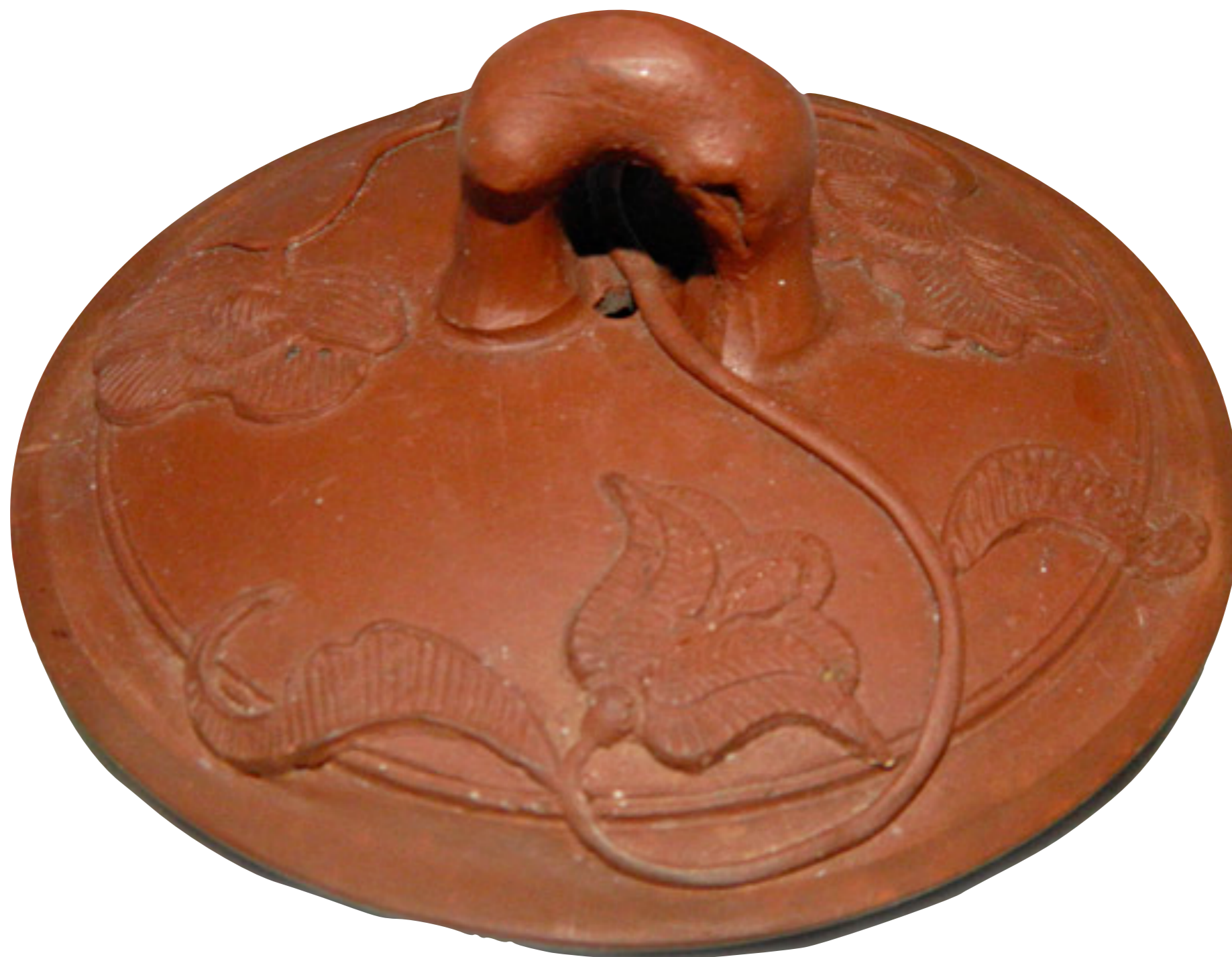
English Red Stoneware Punch Pot Cover from Staffordshire