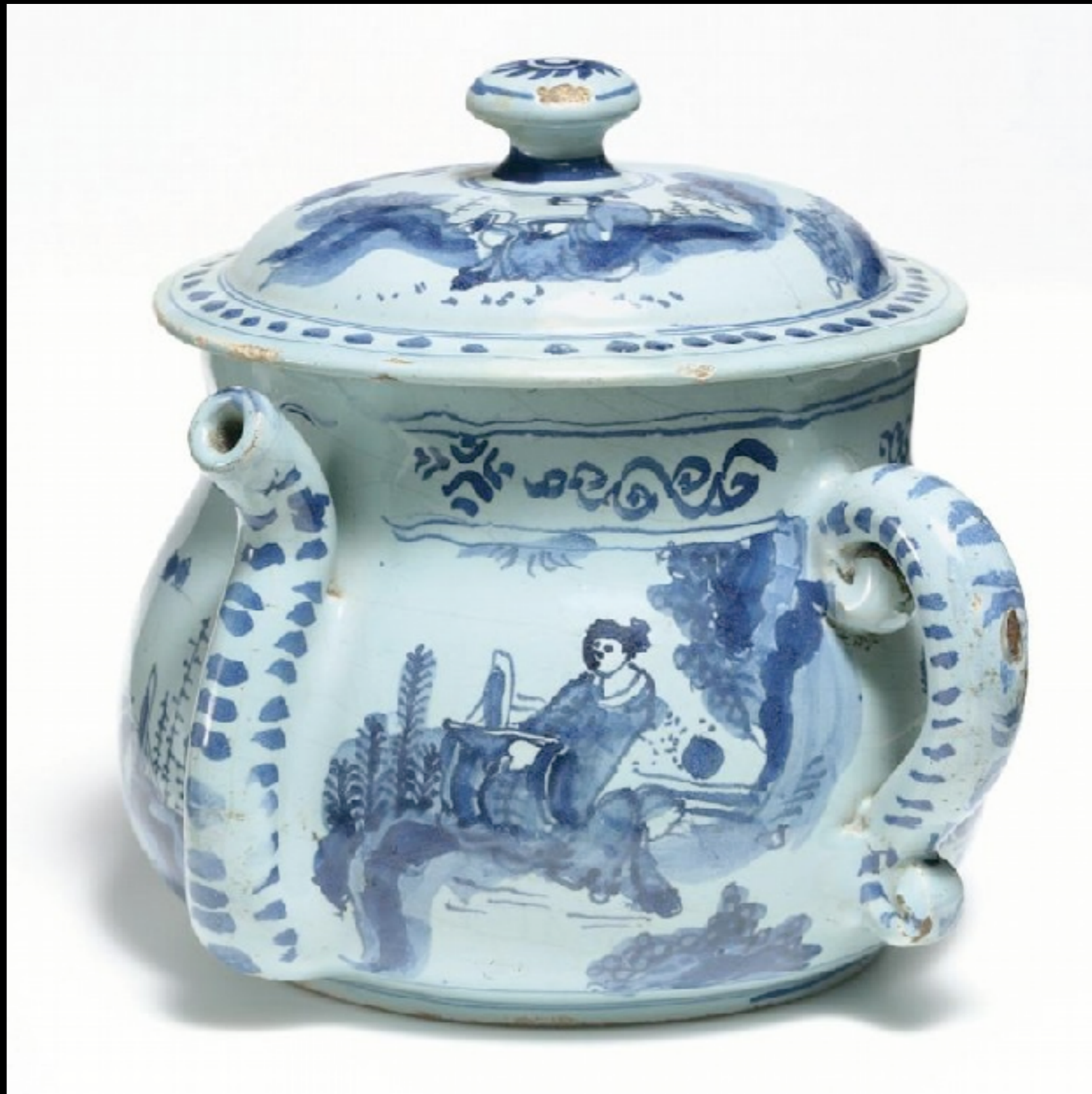
English Tin Glazed Posset Pot from Bristol c. 1690 (Sotheby's Auction House)