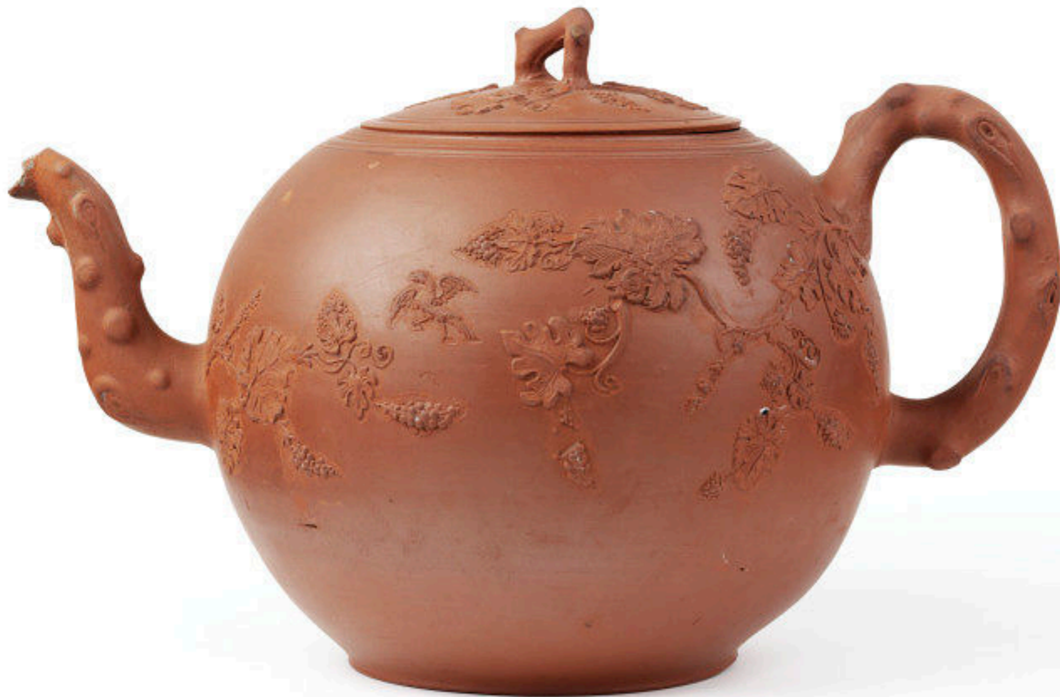
English Red Stoneware Punch Pot from Staffordshire