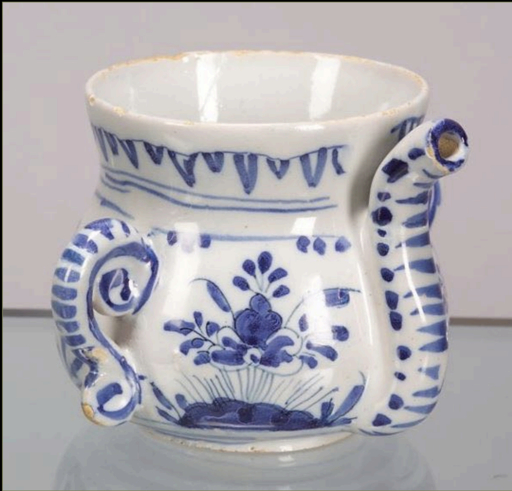
English Tin Glazed Earthenware Posset Pot Mid 18th Century (Private Collection)