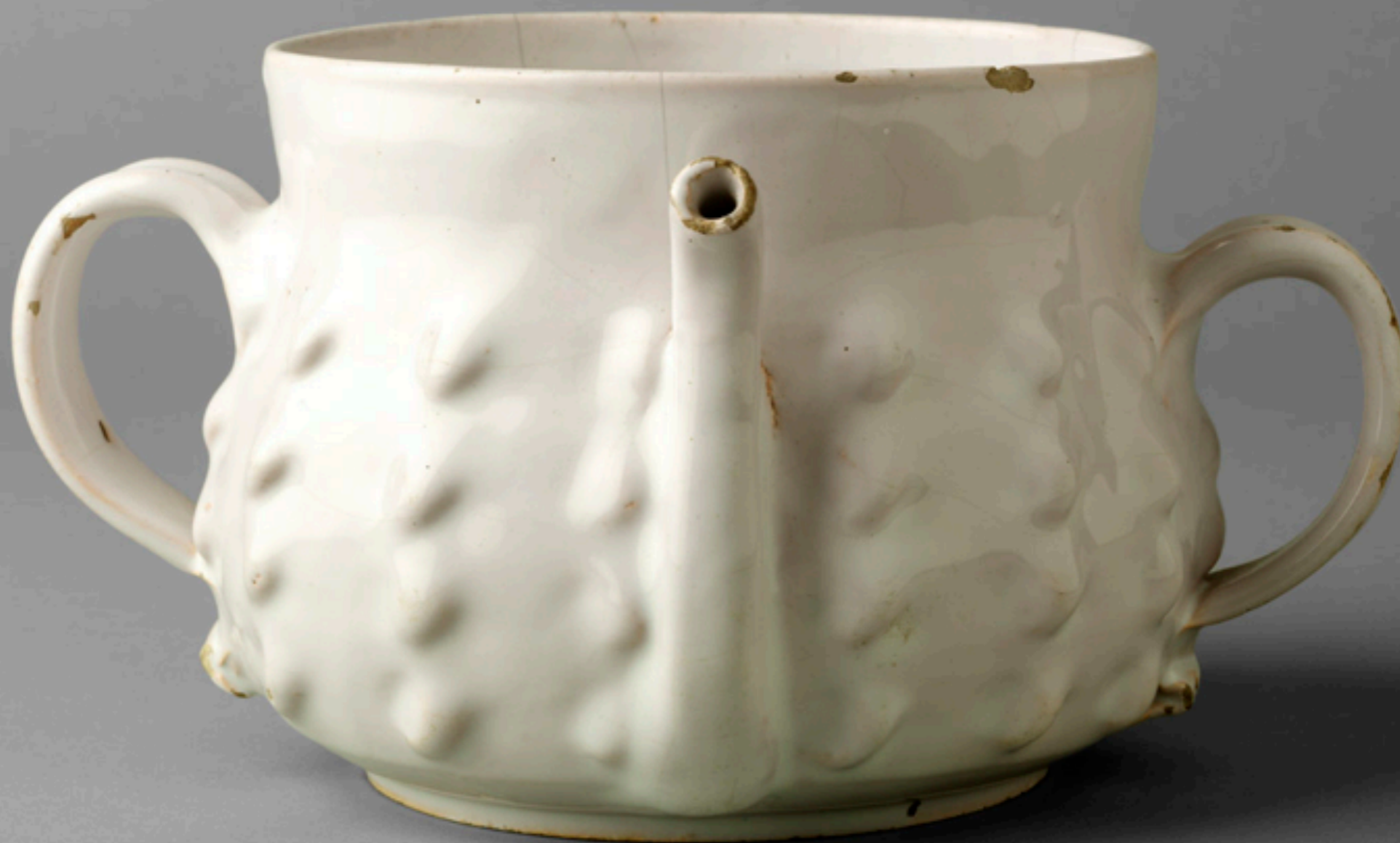
English Tin Glazed Earthenware Posset Pot from Southwark c. 1650 - 1660 (Winterthur)