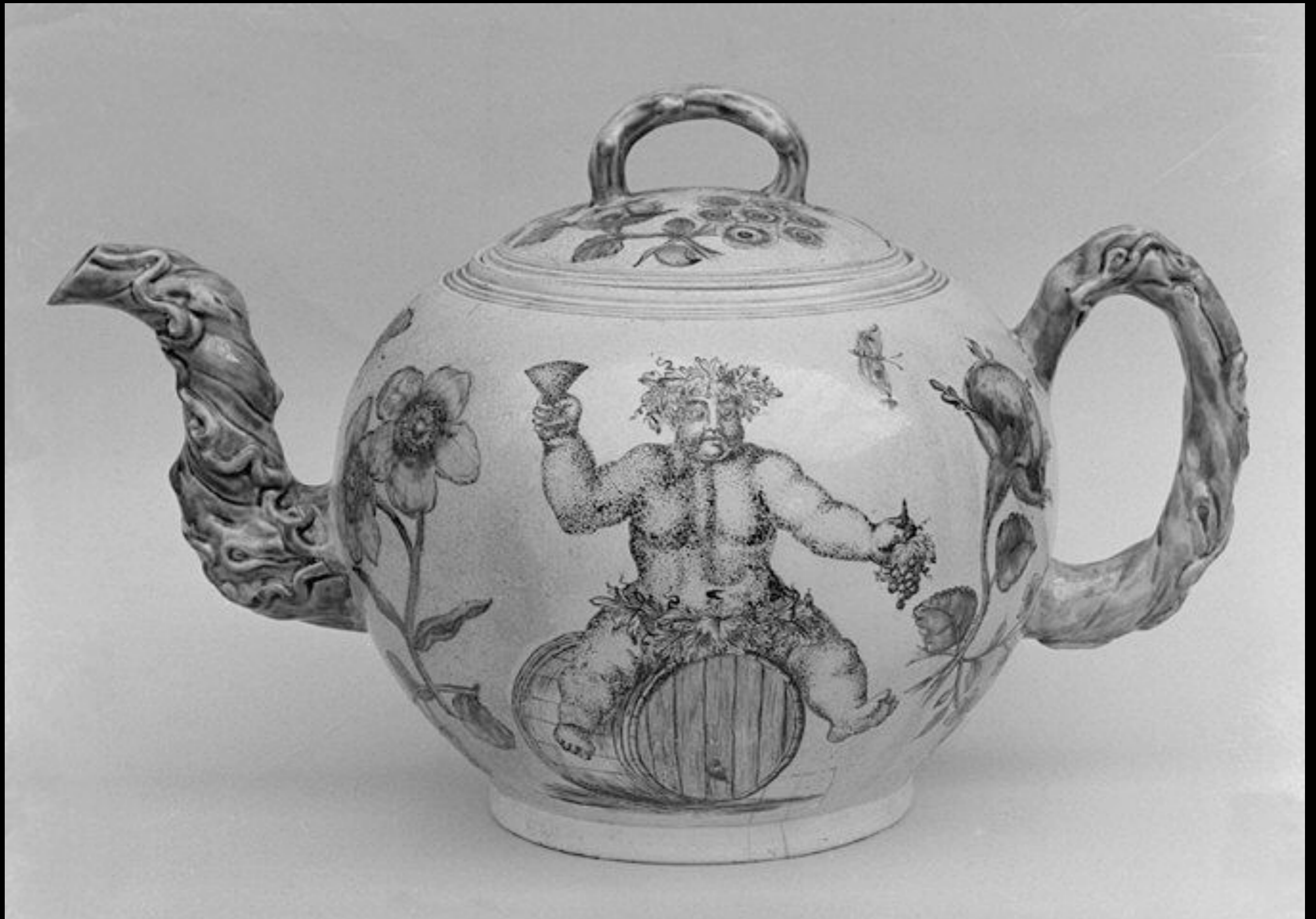
English Salt Glazed Stoneware Punch Pot from Staffordshire c. 1760 - 1765 (Metropolitan Museum of Art)