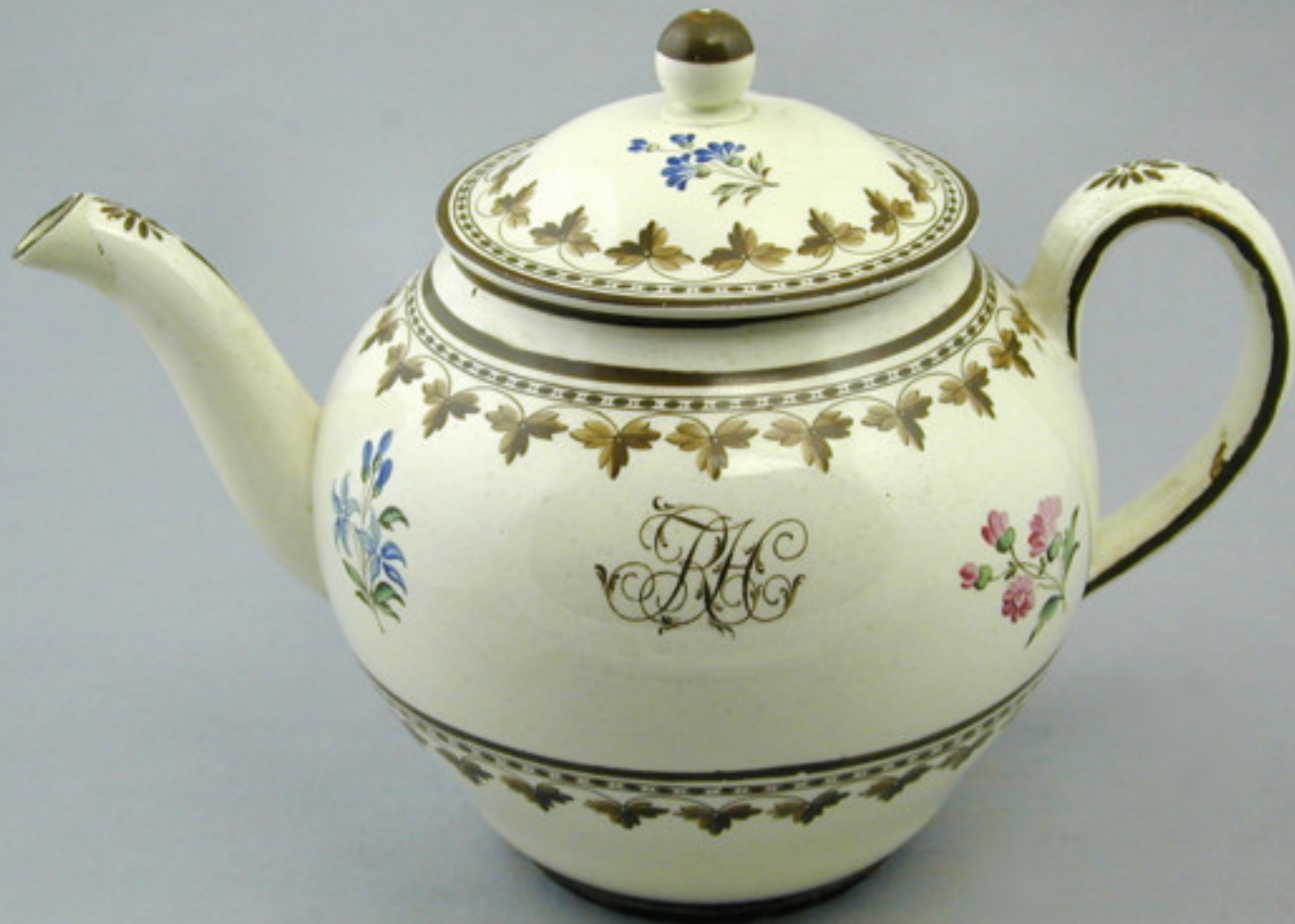
English Lead Glazed Earthenware / Creamware Punch Pot by Josiah Wedgwood c. 1780