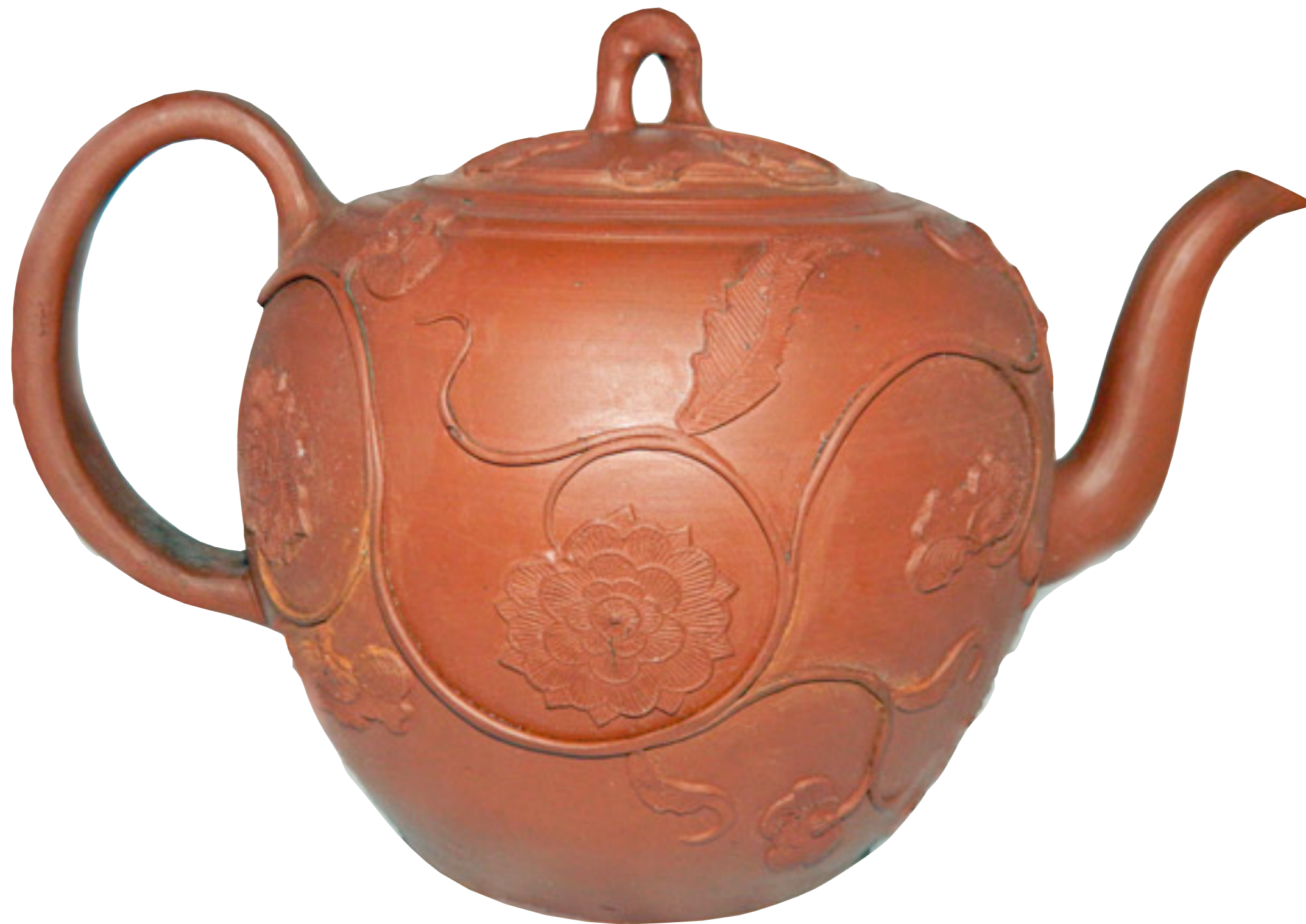
English Red Stoneware Punch Pot from Staffordshire