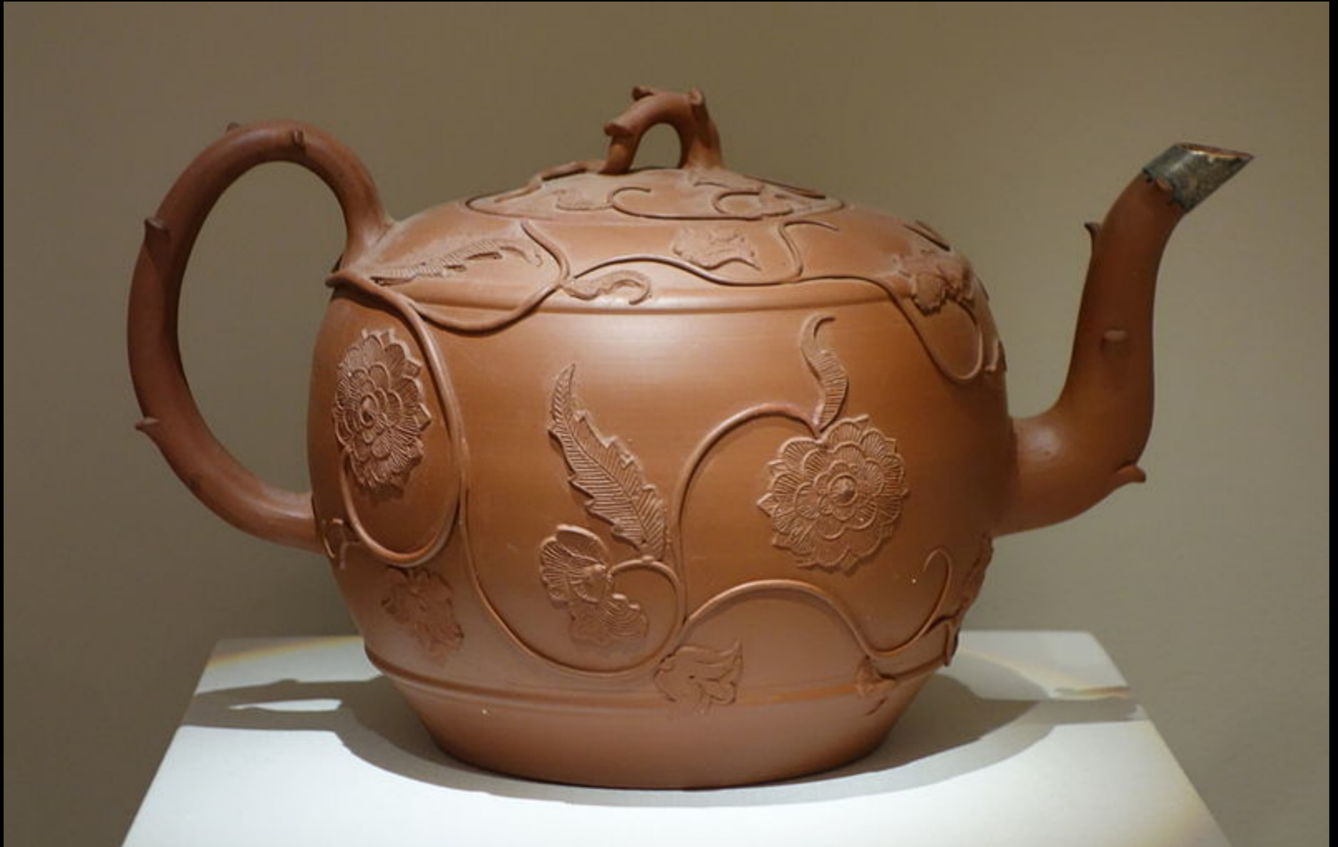
English Red Stoneware Punch Pot from Staffordshire