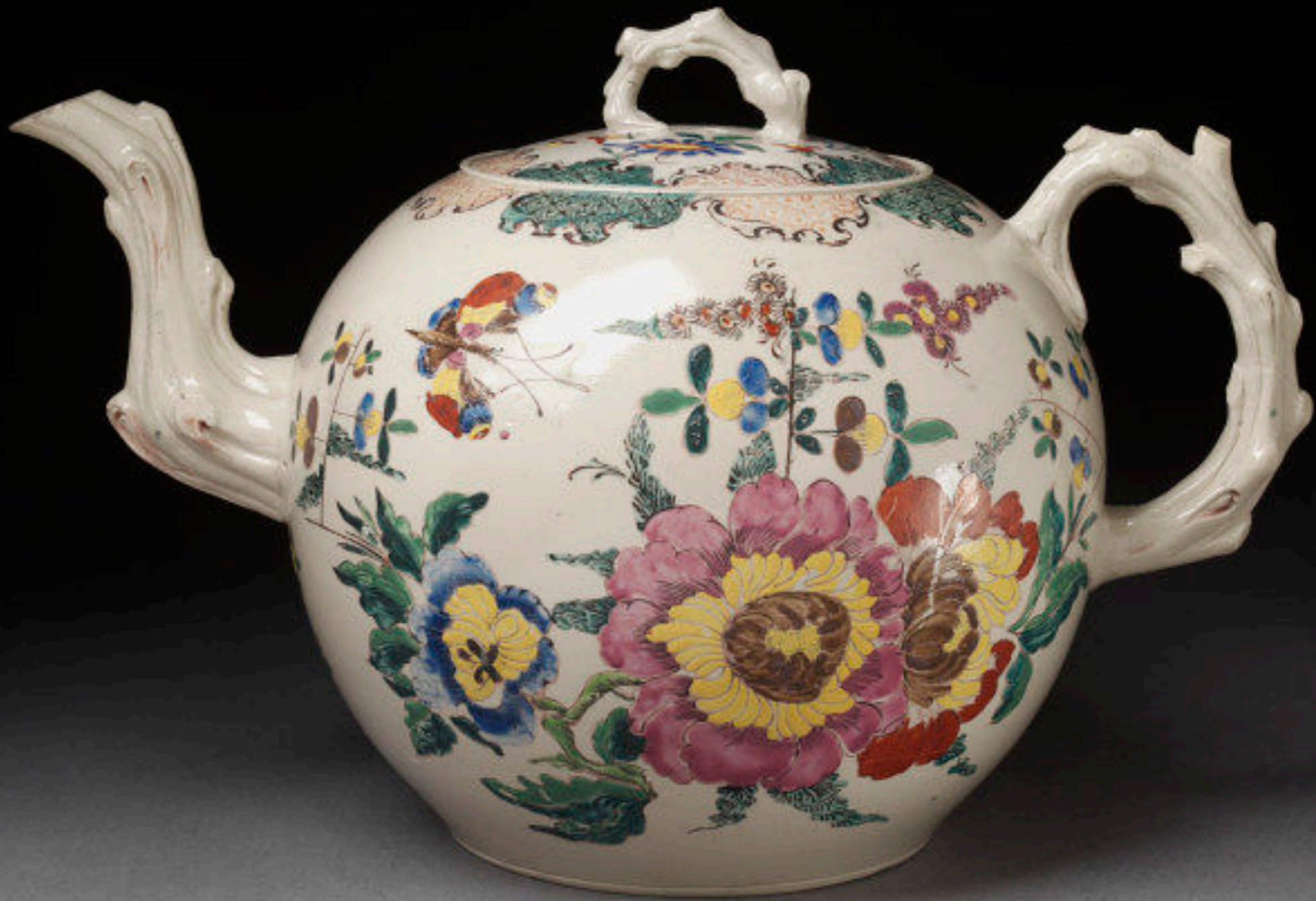
English Salt Glazed Stoneware Punch Pot from Staffordshire c. 1750 = 1760 (Victoria & Albert Museum)