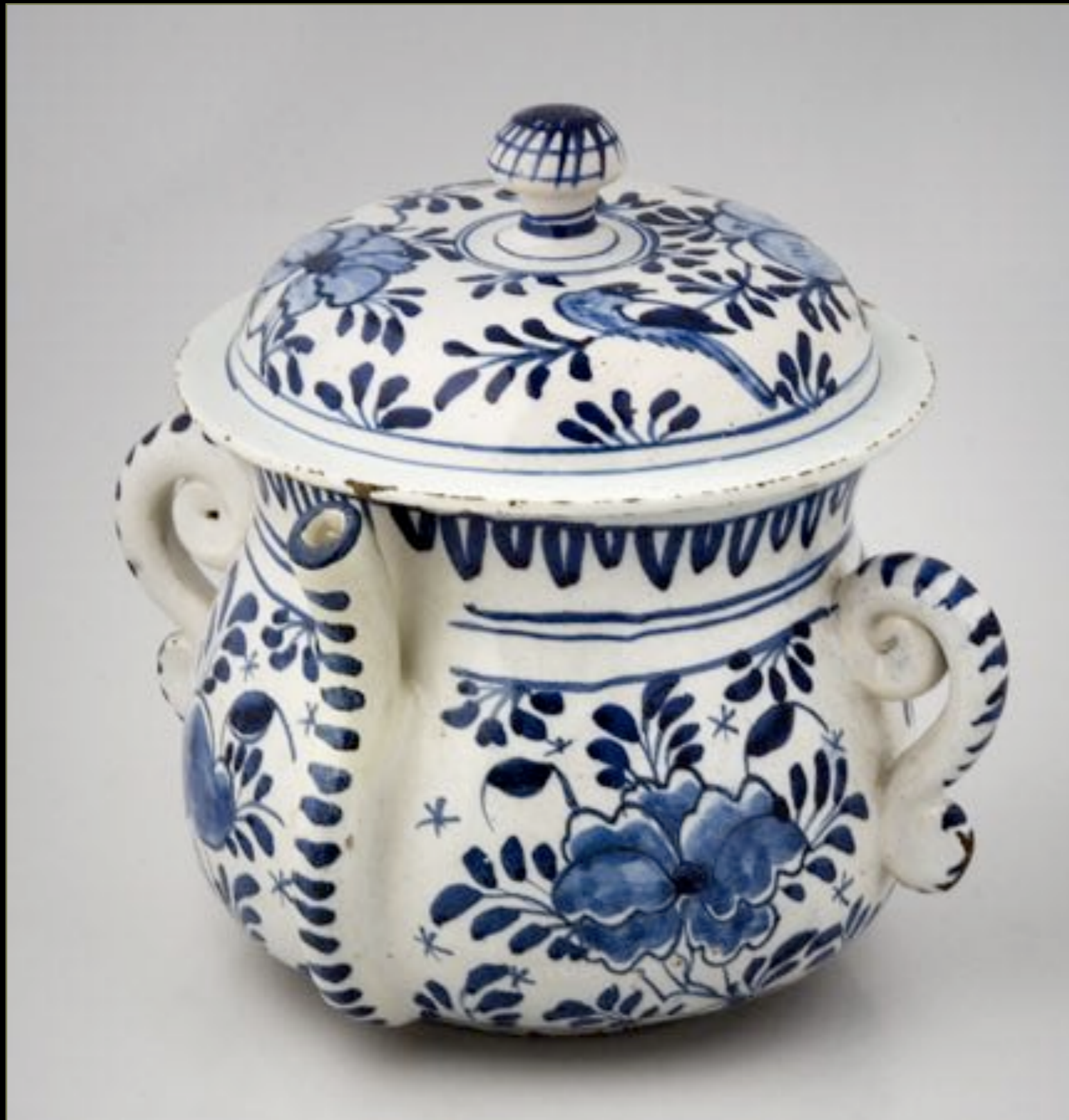
English Tin Glazed Earthenware Posset Pot from Bristol