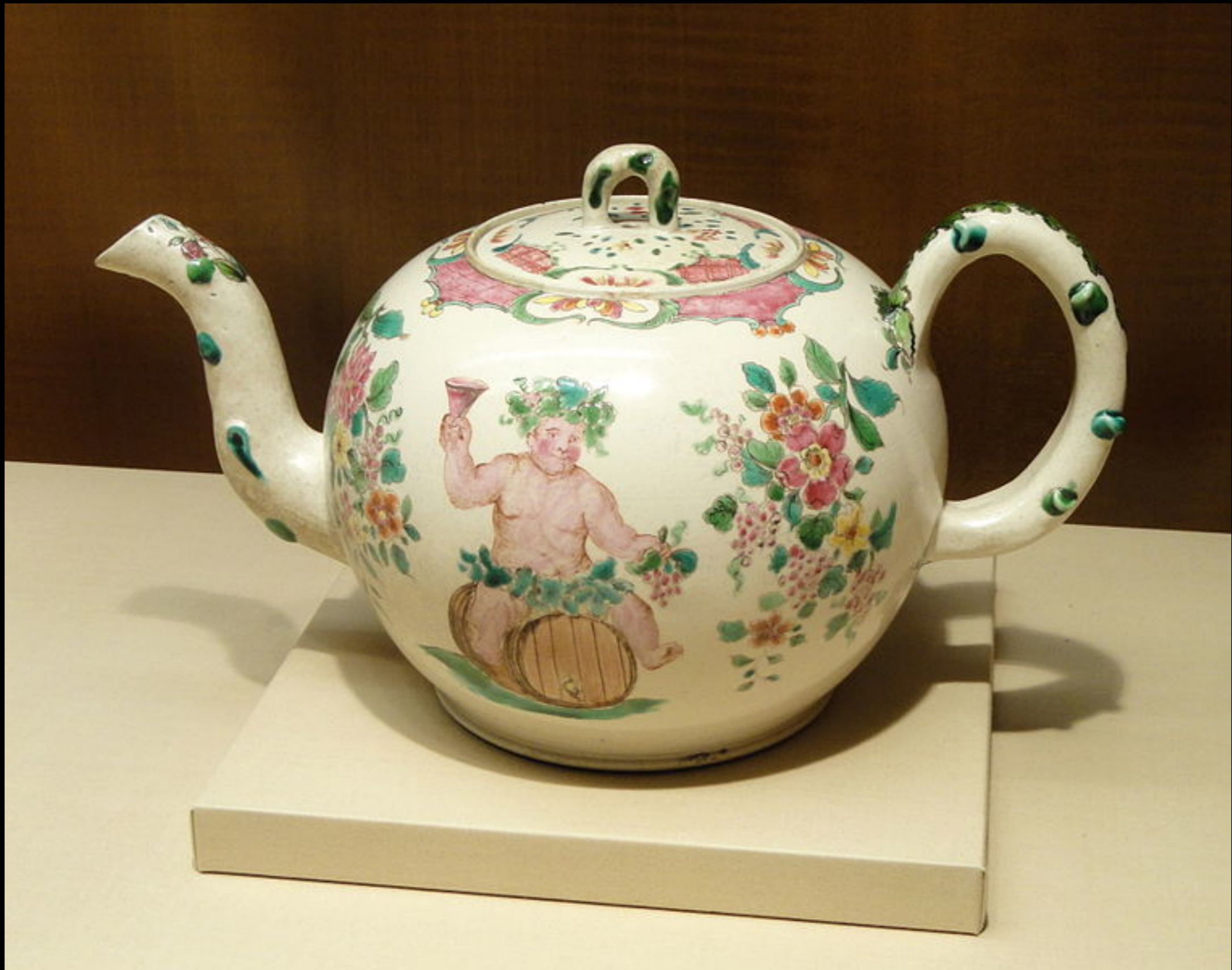
English Salt Glaze Stoneware Punch Pot from Staffordshire c. 1760 - 1765 (Nelson Atkins Museum of Art)