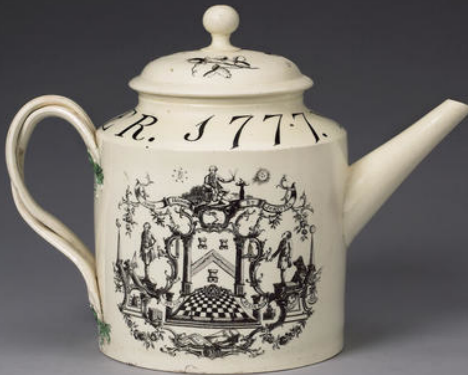
English Lead Glazed Earthenware Punch Pot with Masonic Transfer