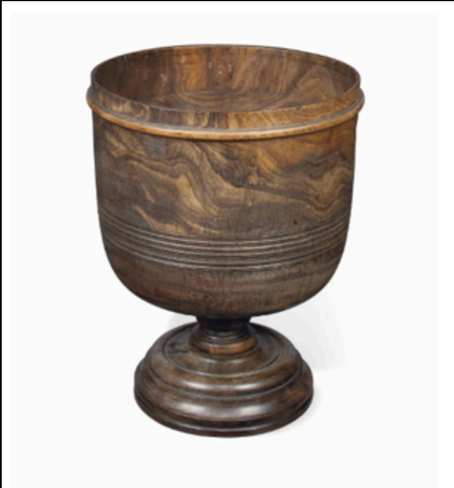
English Lignum Vitae Wassail Bowl Early 18th Century (Christie's)