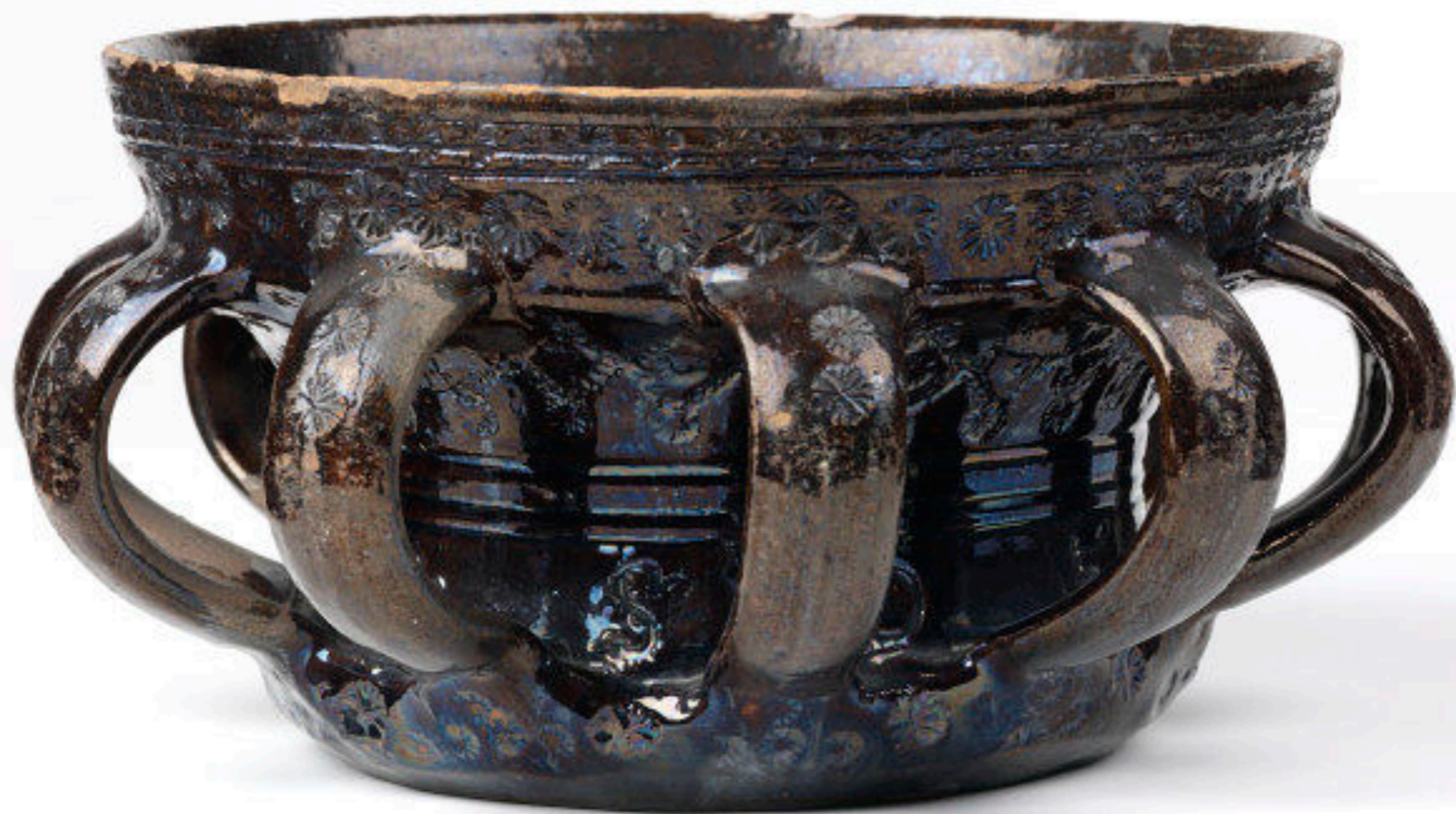
English Lead Glazed Earthenware Wassail Bowl from Wilshire Dated 14/12/1682 (Victoria & Albert)