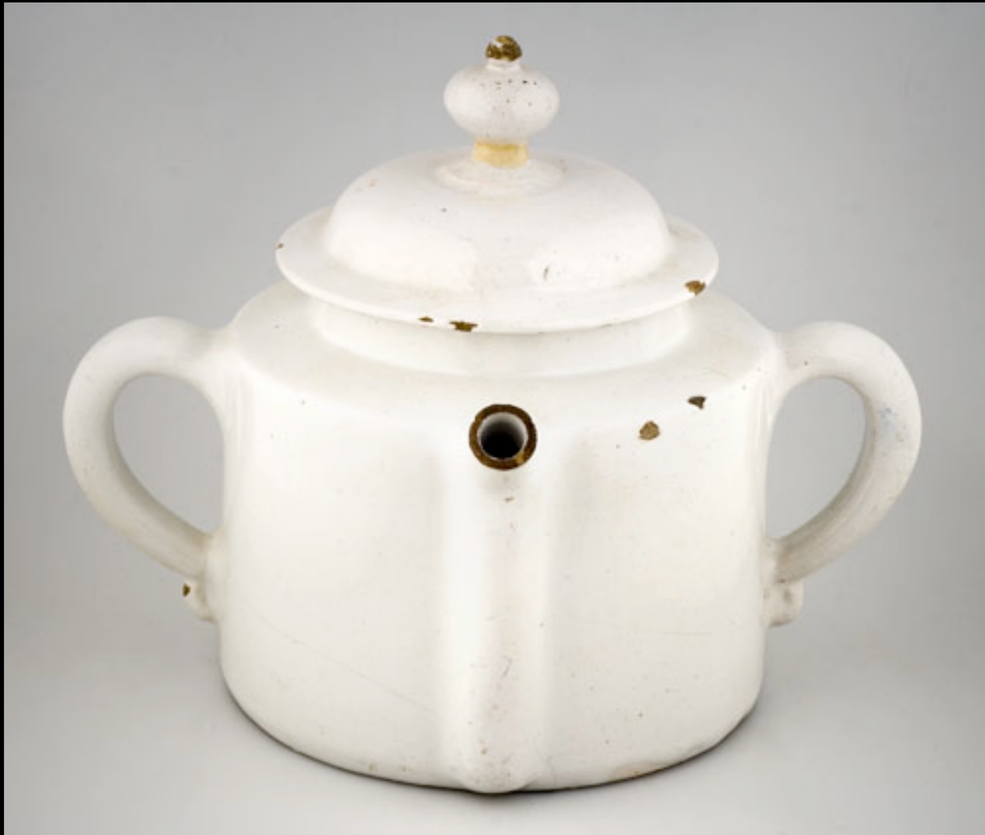
Dutch Tin Glazed Earthenware Posset Pot c. 1660 - 1680 (Private Collection)