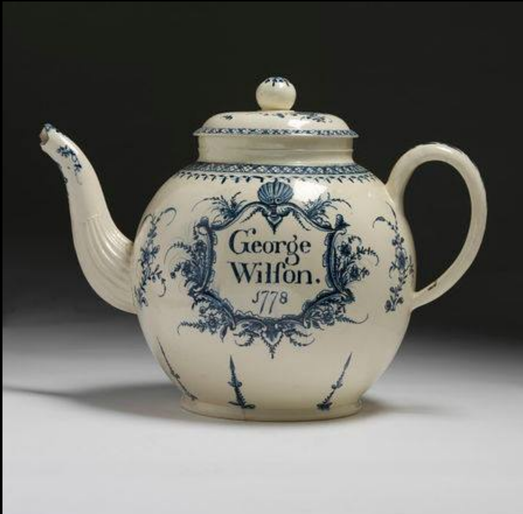
China Glaze Punch Pot 1778 (Victoria & Albert)