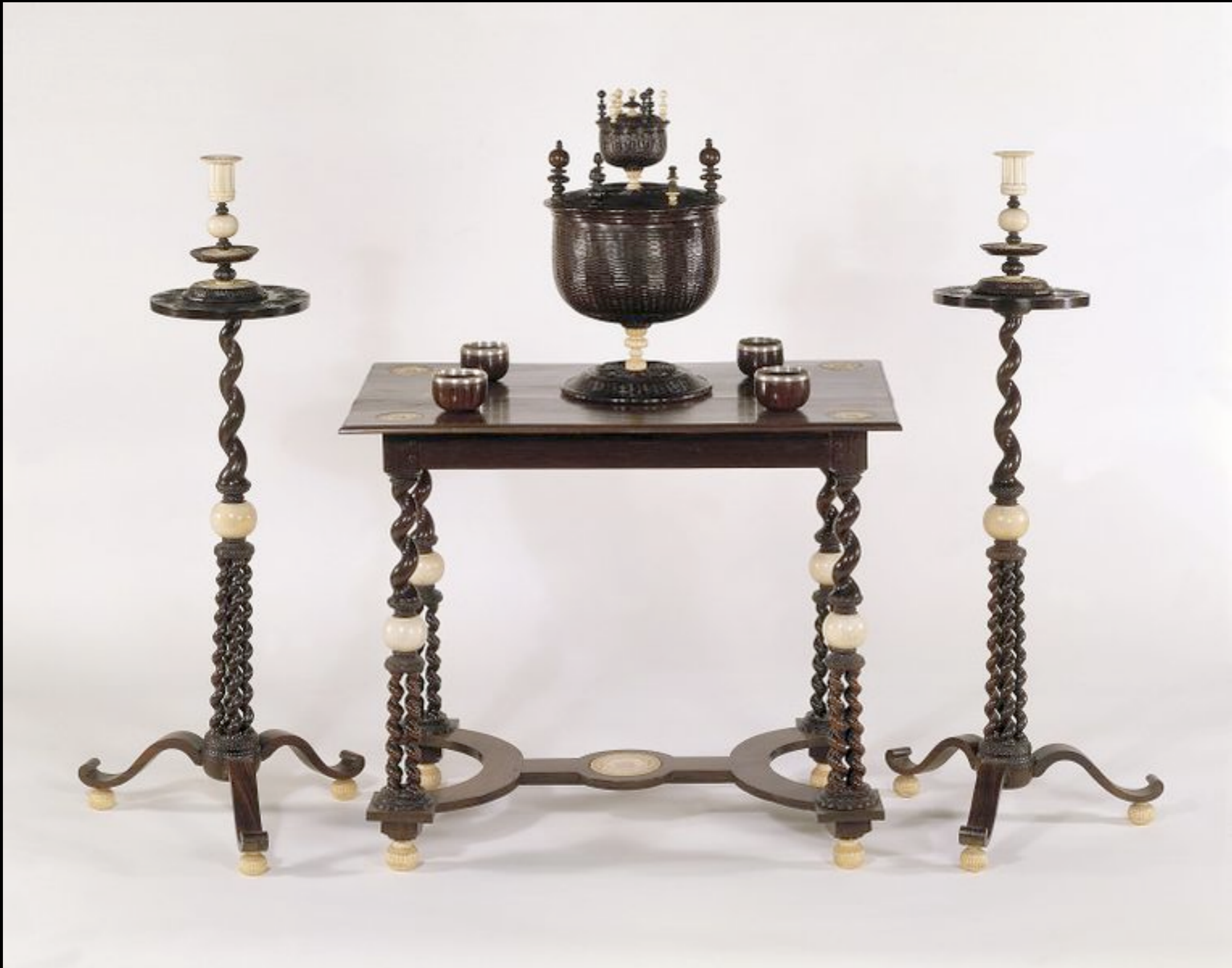
Lignum Vitae Wassail Stand, Candlesticks Bowl & Cups c. 1640 - 1680 (Victoria & Albert)