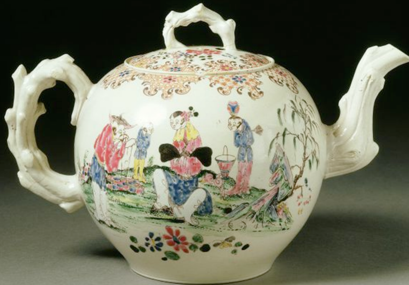
English Salt Glazed Stoneware Punch Pot from Staffordshire c. 1755 - 1760 (Victoria & Albert Museum)