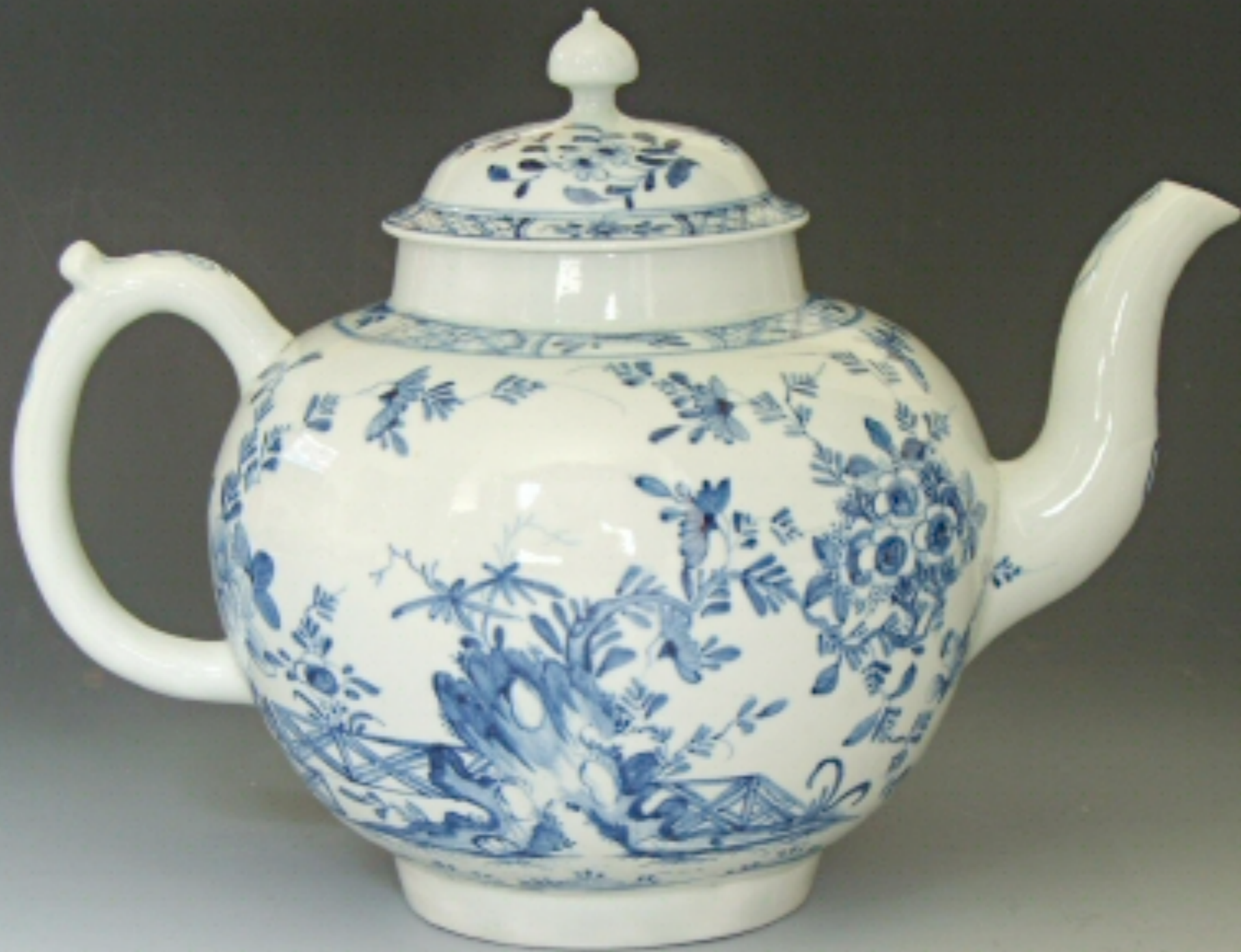
English "Scratch Cross" Porcelain Punch Pot from Worcester