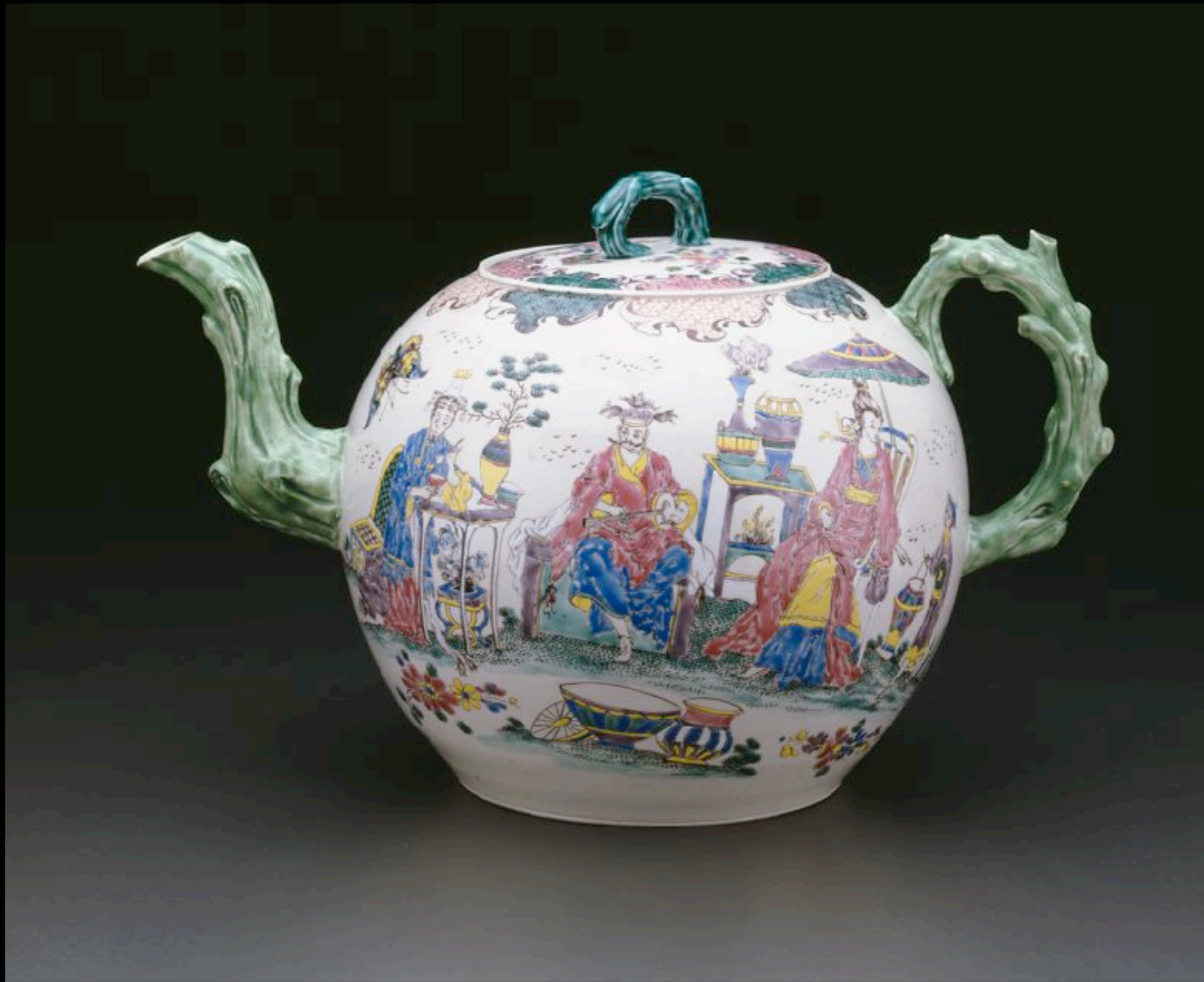
English Salt Glazed Stoneware Punch Pot from Staffordshire c. 1755 - 1760 (Art Institute Chicago)