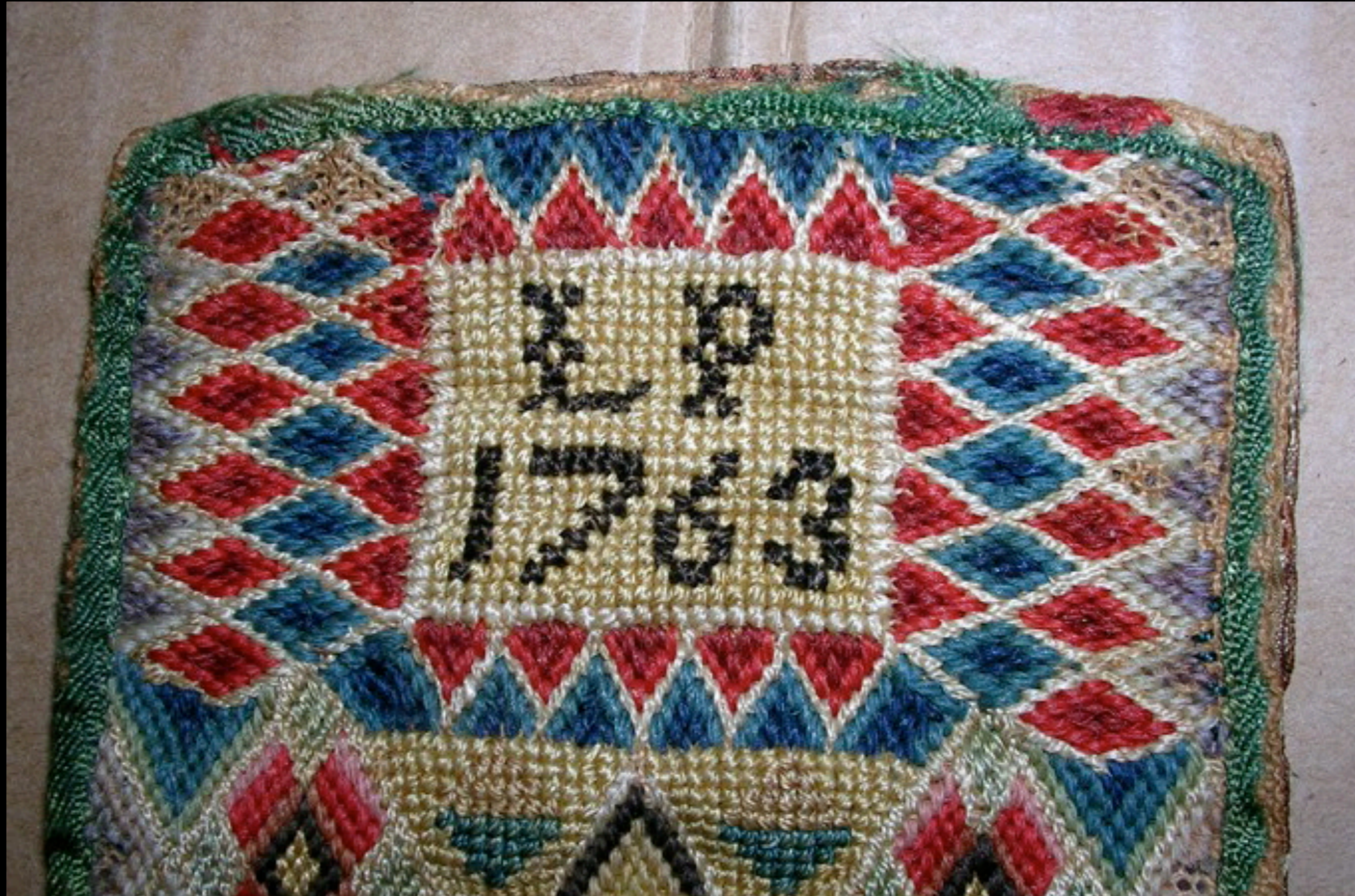
Canvaswork Roll-Up Huswif American 1763 (Skinner Auction House)