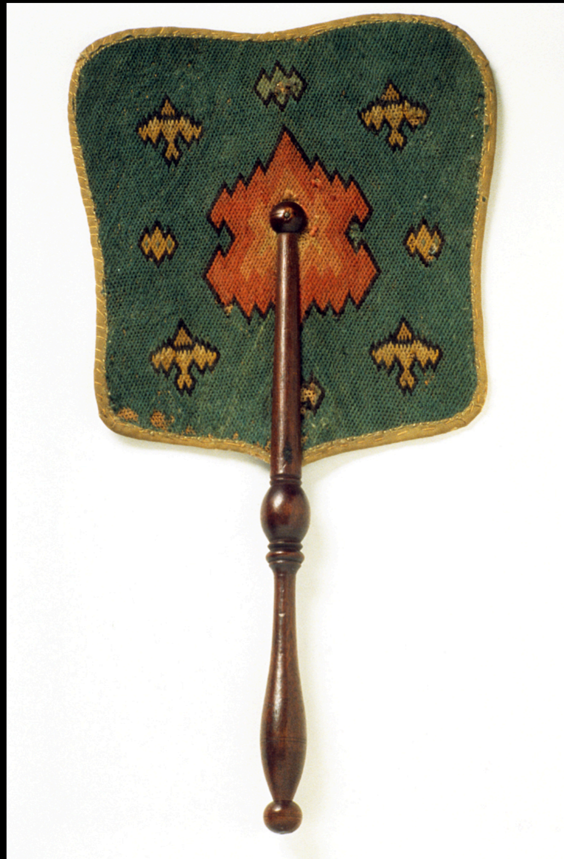
Hand Screen Fan