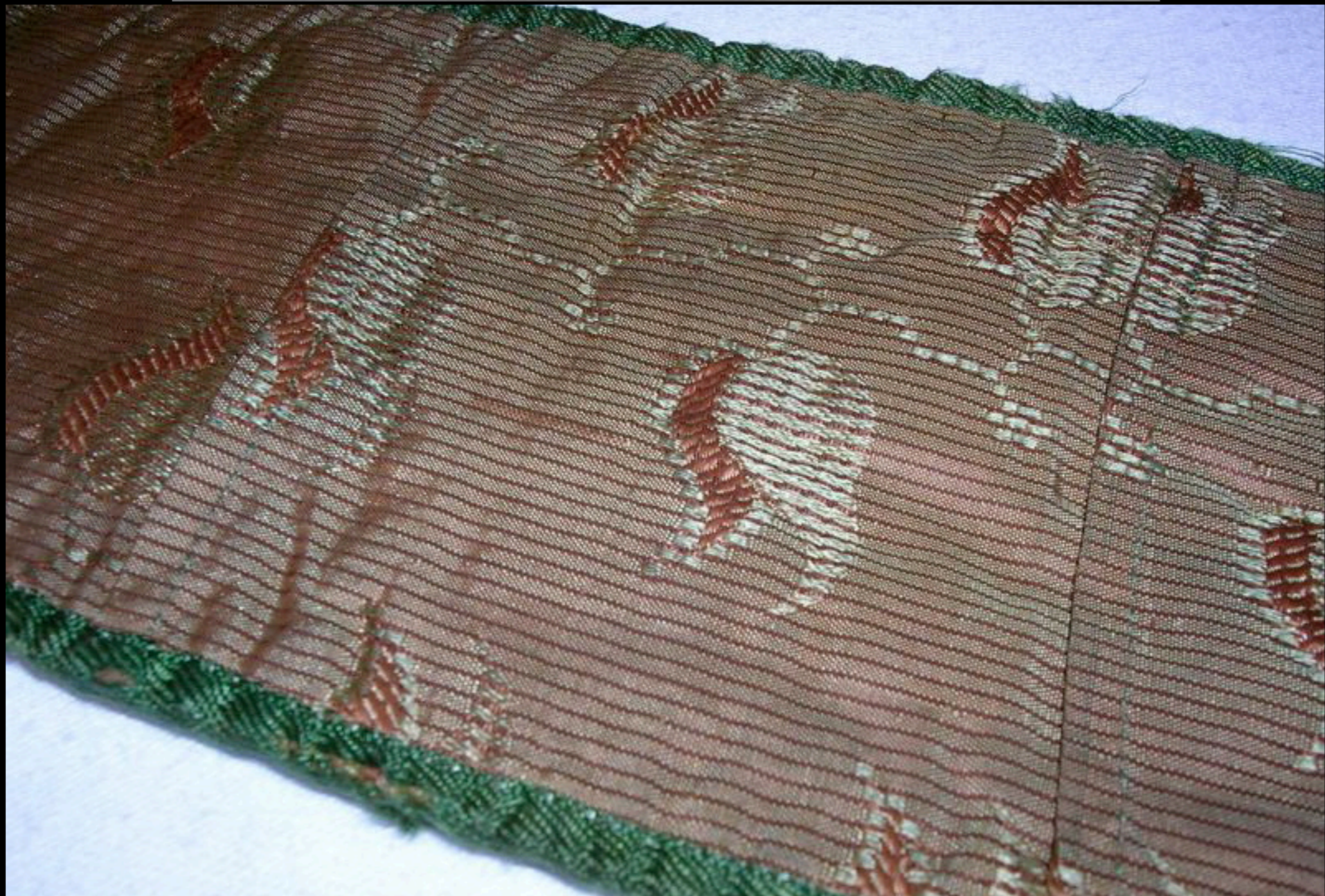
Canvaswork Roll-Up Huswif American 1763 (Skinner Auction House)