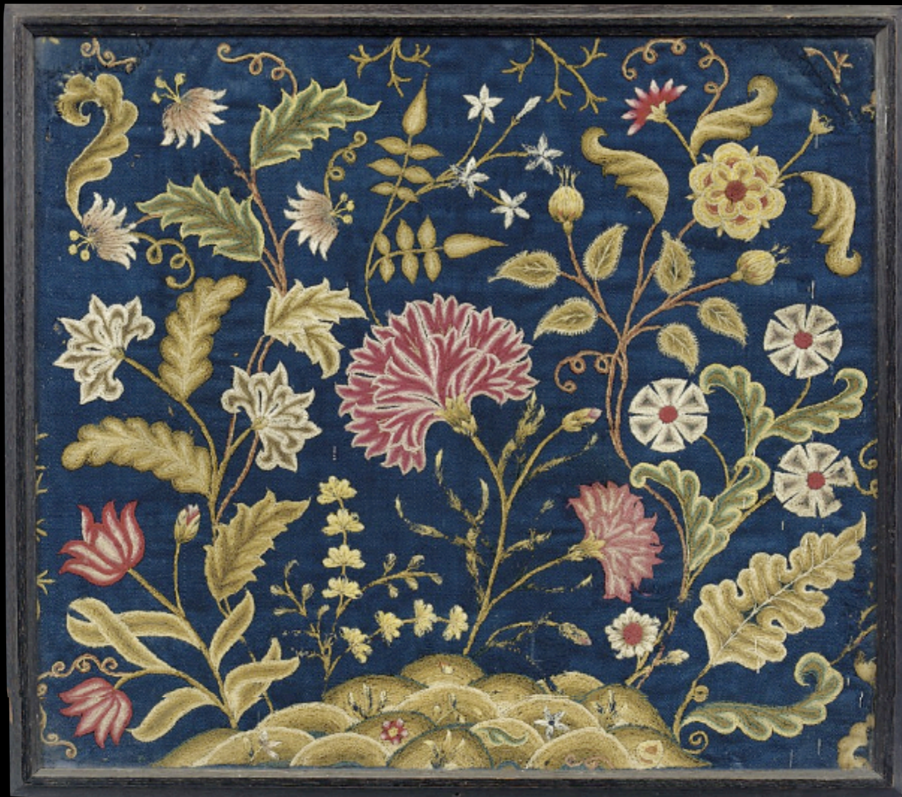
English Blue Linen Embroidered Picture