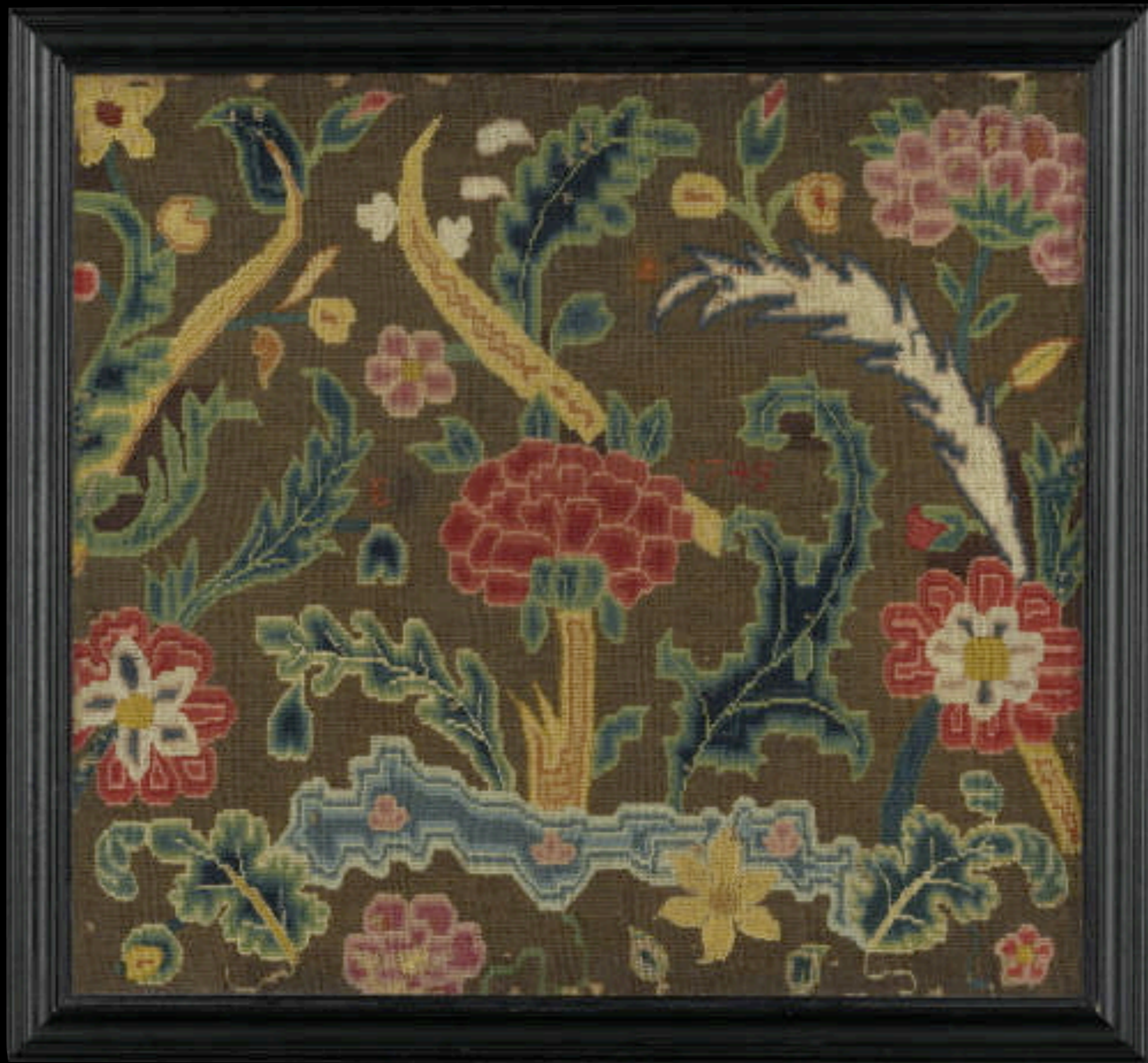
New England Wool and Silk Canvas Floral Needlework Picture Stitched "E B 1745" (Christie's Auction House)