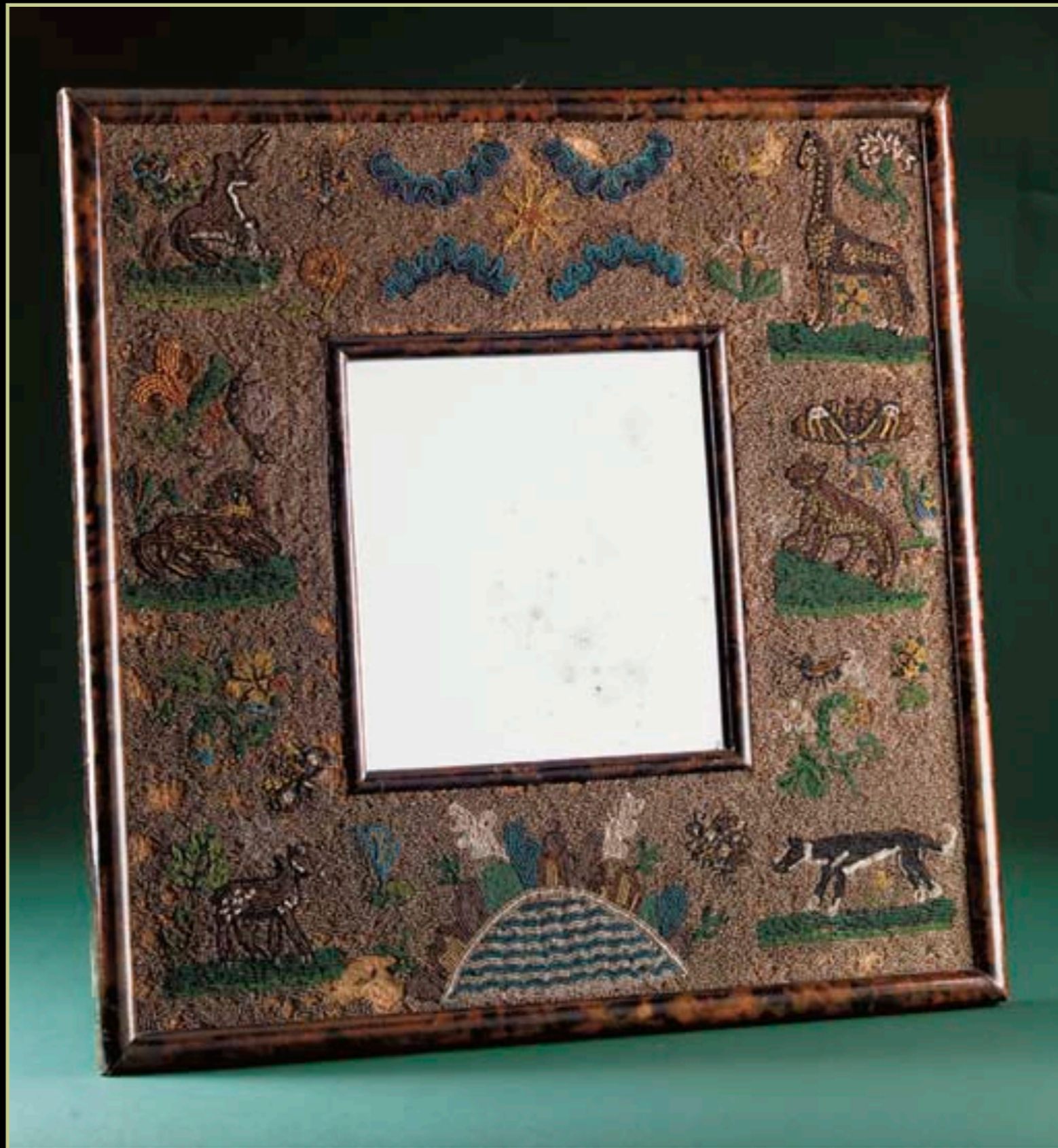
Beadwork Mirror 17th Century (Christie's Auction House)