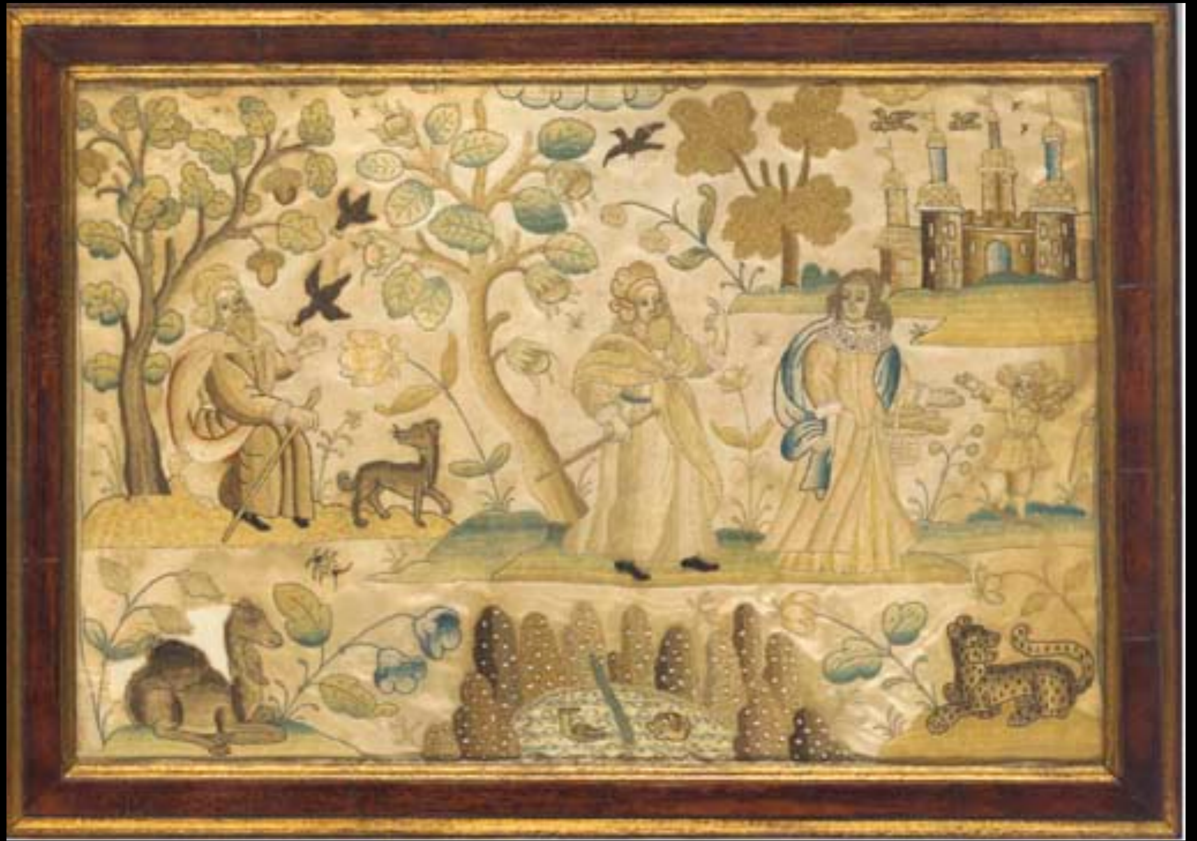
Needlework Picture in Colored Silks on a Ivory Satin Ground Mid 17th Century (Christie's Auction House)