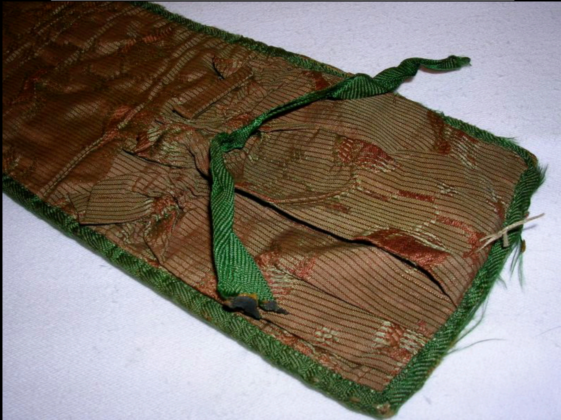
Canvaswork Roll-Up Huswif American 1763 (Skinner Auction House)