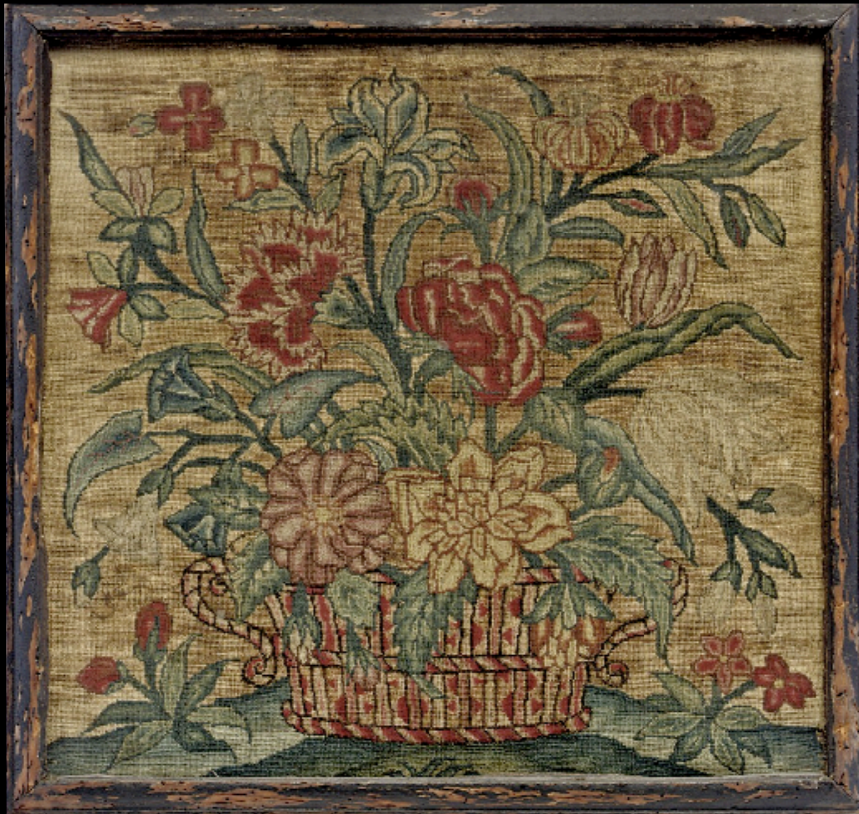
English Embroidered Needlework Picture