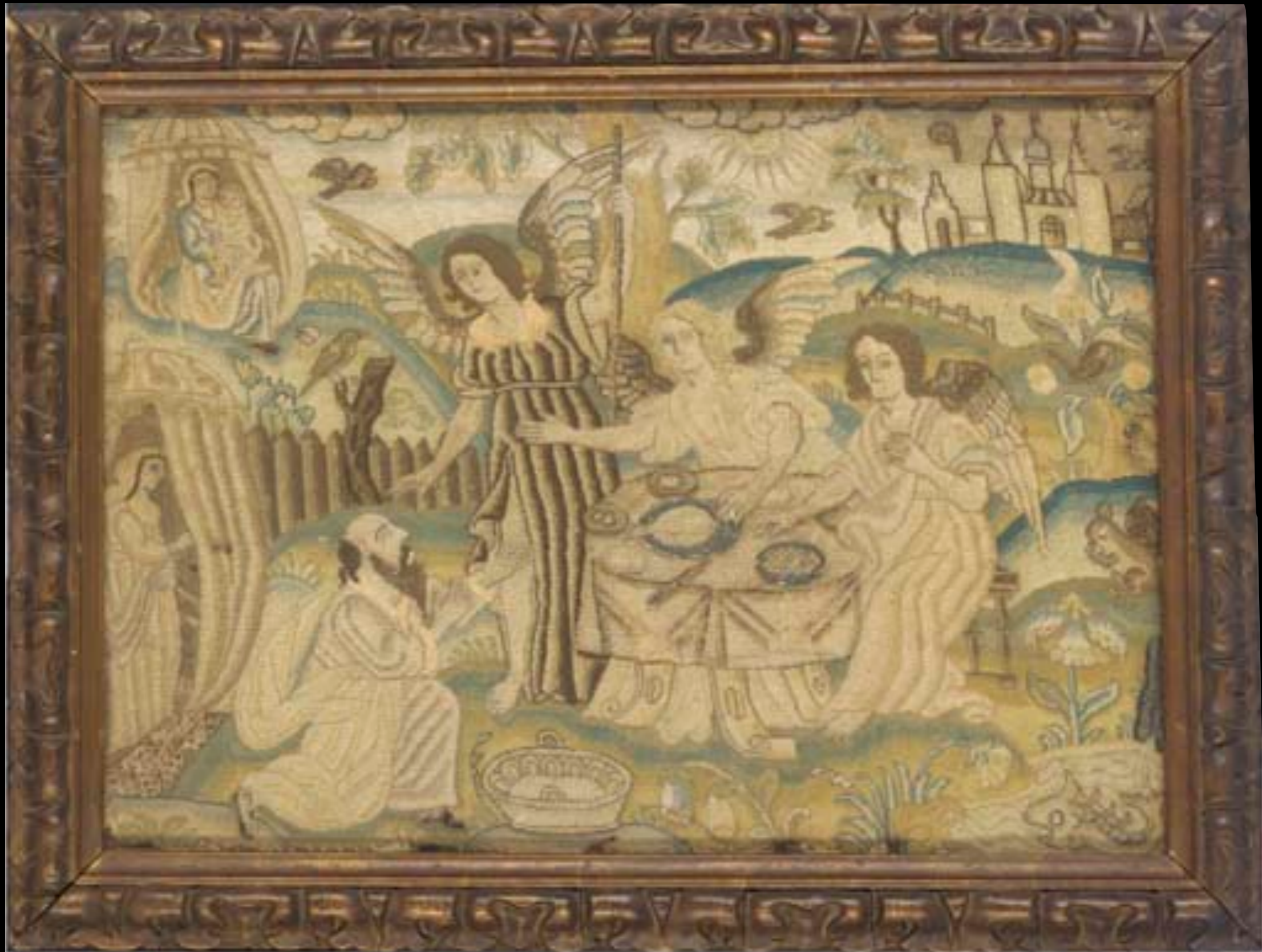
English Tent Stitch Picture Mid 17th Century (Christie's Auction House)