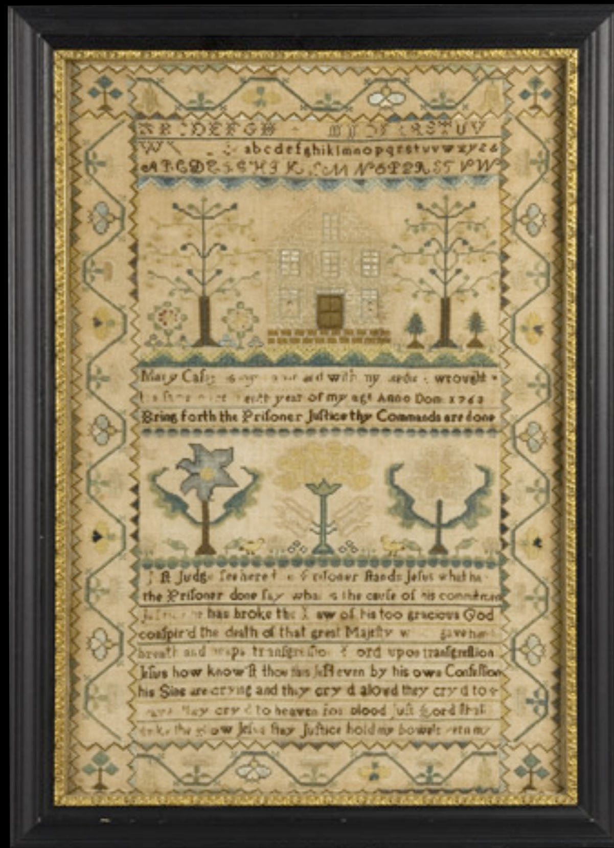
1763 Rhode Island Sampler Sampler: "Mary Casey is my name and with my needle wrought" Rhode Island 1763 (Private Collection)