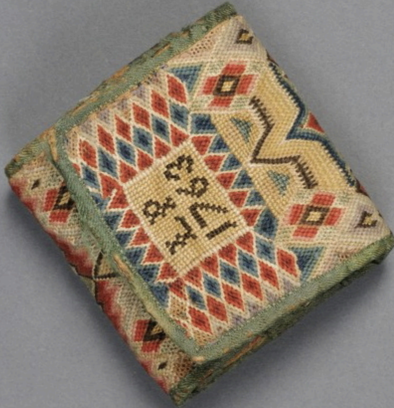
Canvaswork Roll-Up Huswif American 1763 (Skinner Auction House)