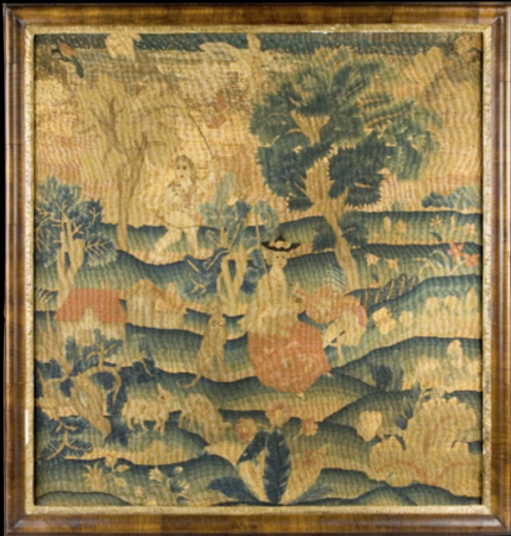
English Pastoral Scene Canvas Work