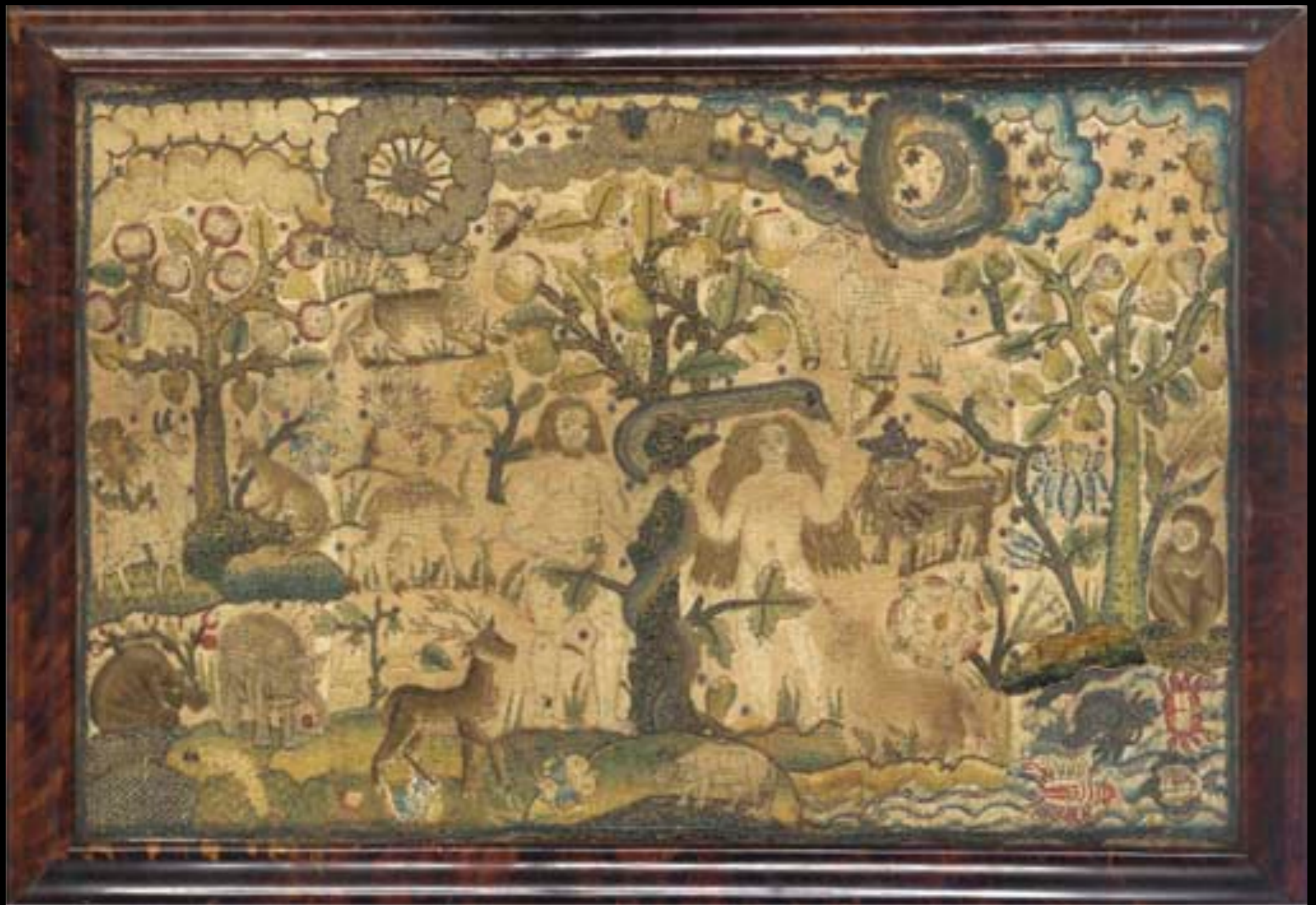
Needlework Picture in Colored Silks, Metal Thread, Purl and Chenille Mid 17th Century (Christie's Auction House)