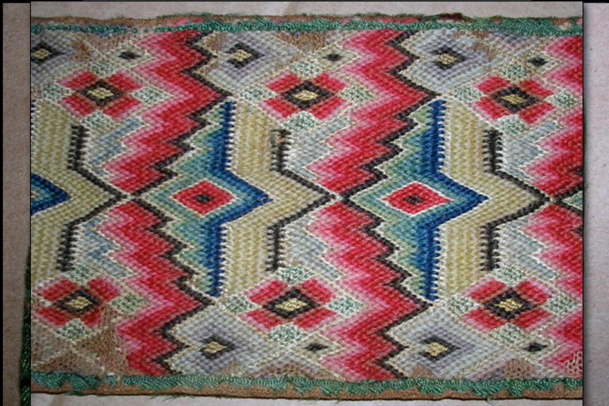
Canvaswork Roll-Up Huswif American 1763 (Skinner Auction House)