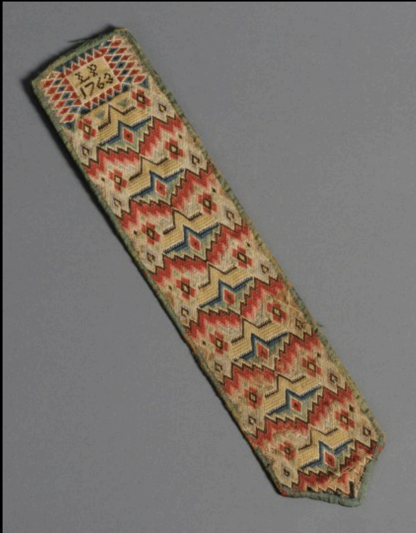
Canvaswork Roll-Up Huswif American 1763 (Skinner Auction House)