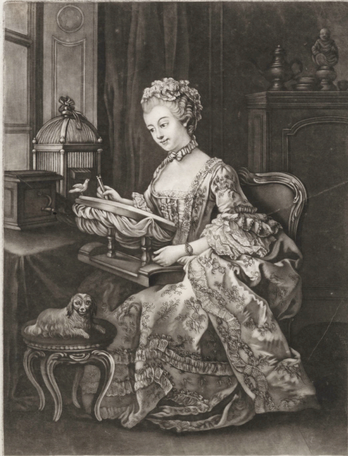
Printed for CARINGTON BOWLES, Map & Printseller. The FAIR LADY working TAMBOUR. at N o 69 in St Pauls Church Yard, LONDON.