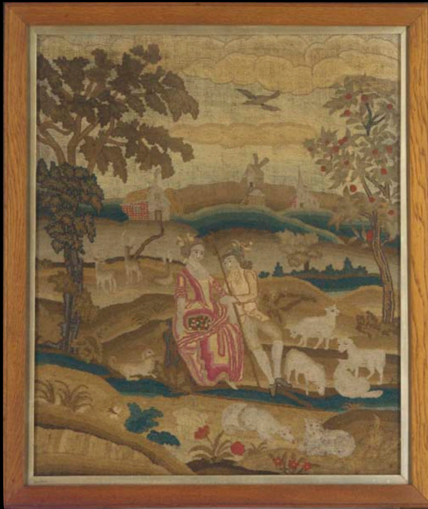
Tent Stitch Picture 1st Half 18th Century (Christie's Auction House)