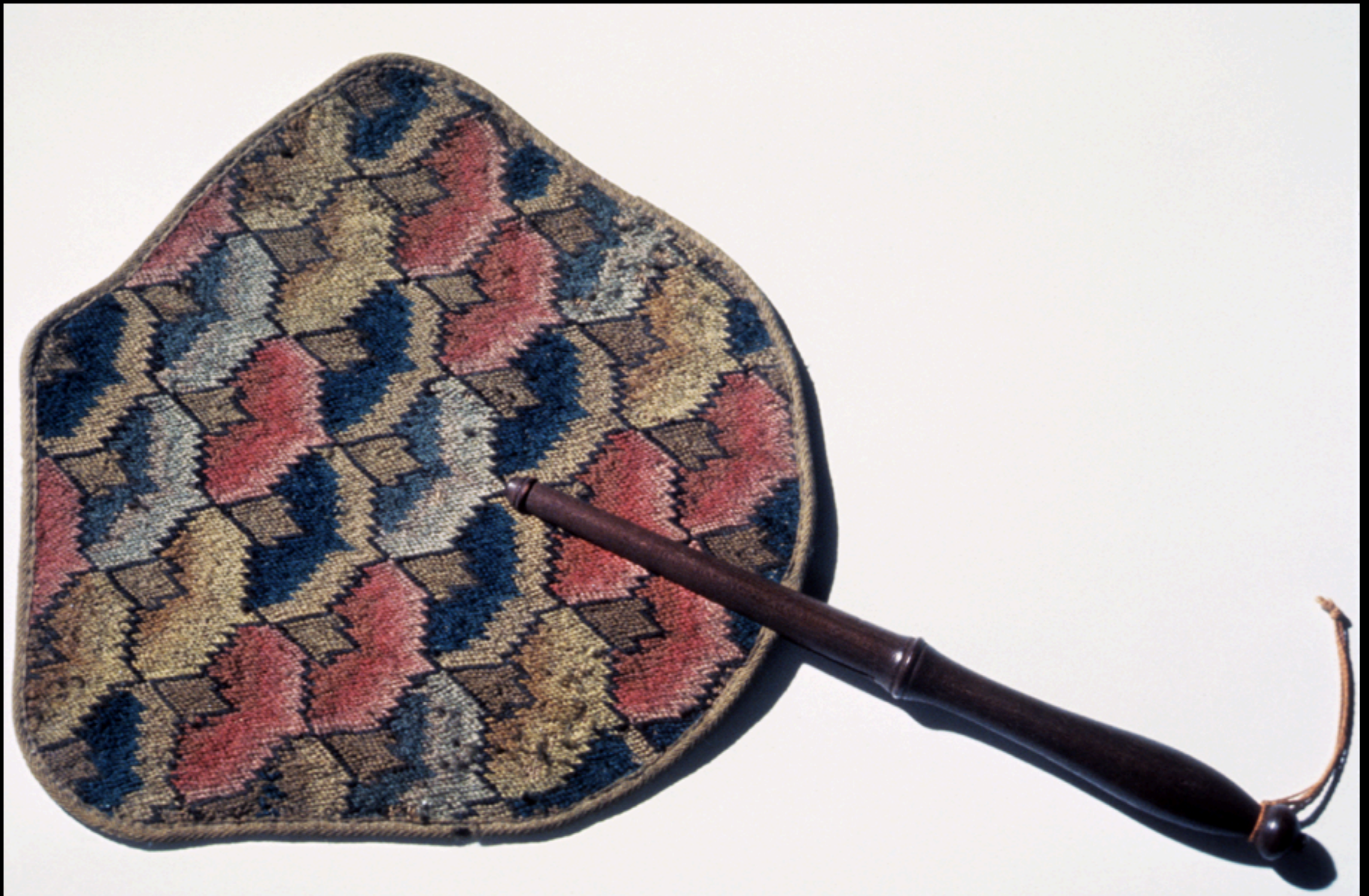
Hand Screen Fan 2nd Half 18th Century (Winterthur)