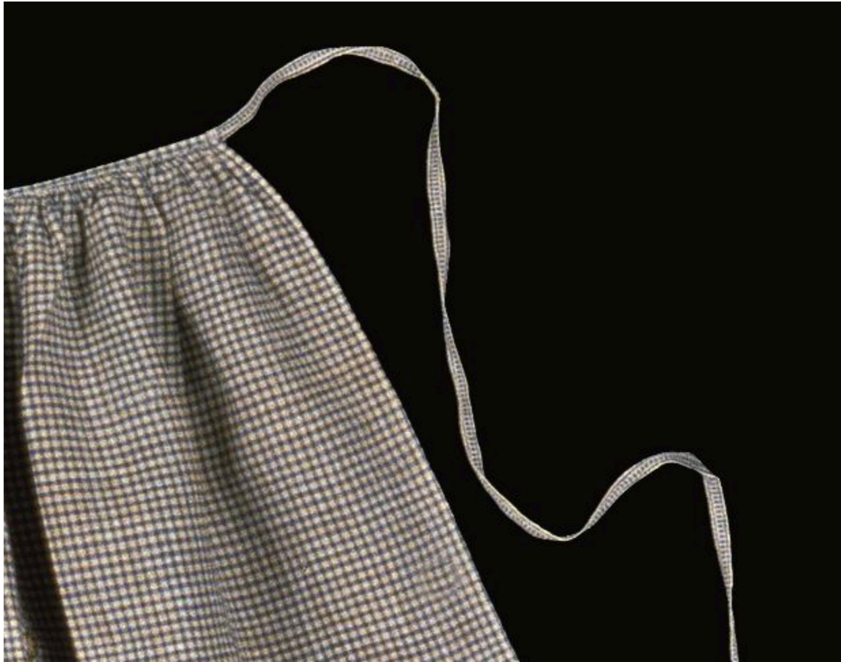
American Checked Linen Apron Marked "E F 1776" (Colonial Williamsburg)