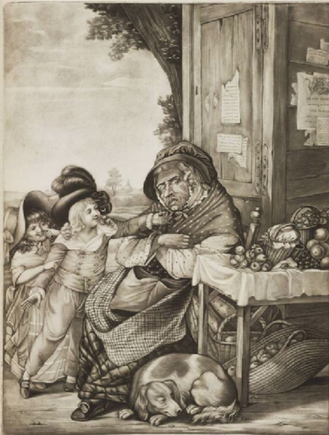
YOUTH AND AGE.

English Checked, Likely Linen, Apron - "YOUTH AND AGE"