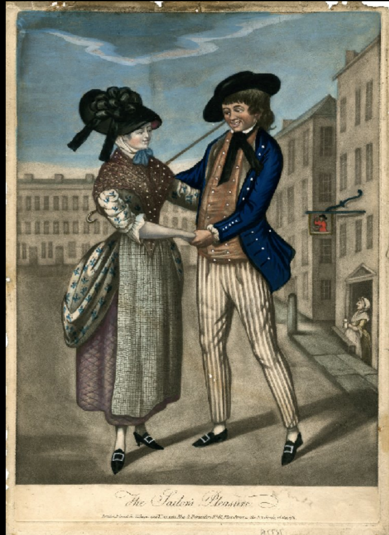
English Checked, Likely Linen, Apron - "The Sailor's Pleasure" by Sayer & Bennett 1781