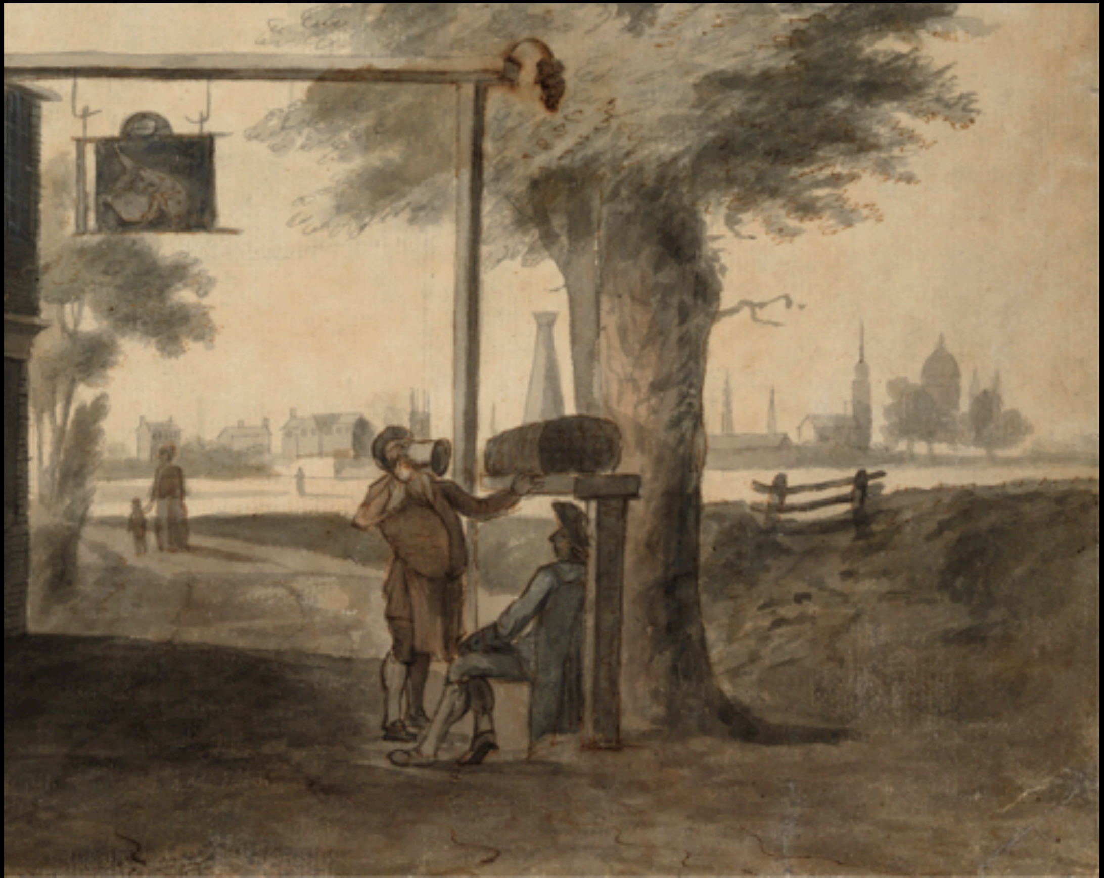
Detail: Near Hackney by Paul Sandby