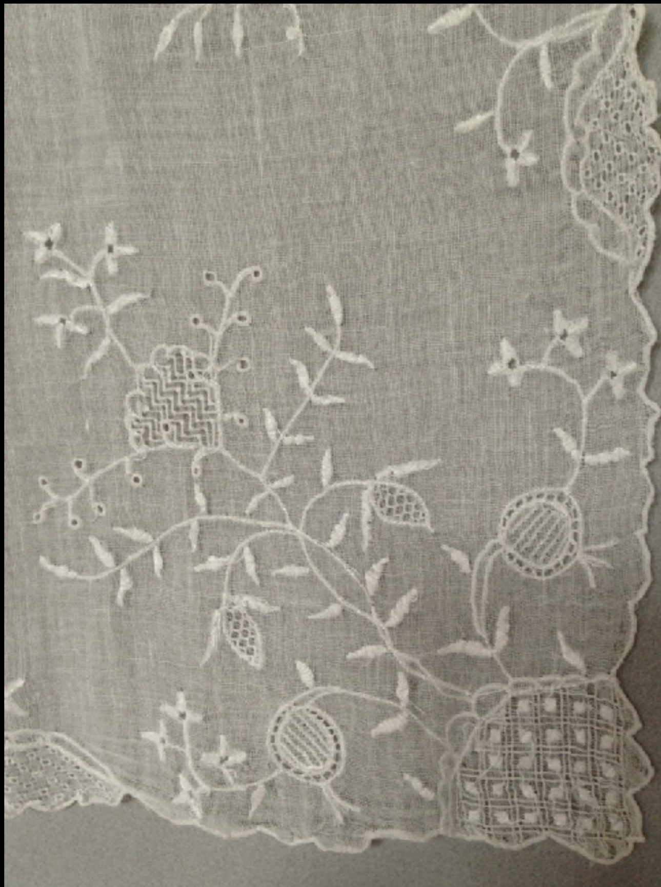
English Muslin Tambour Embroidered Apron