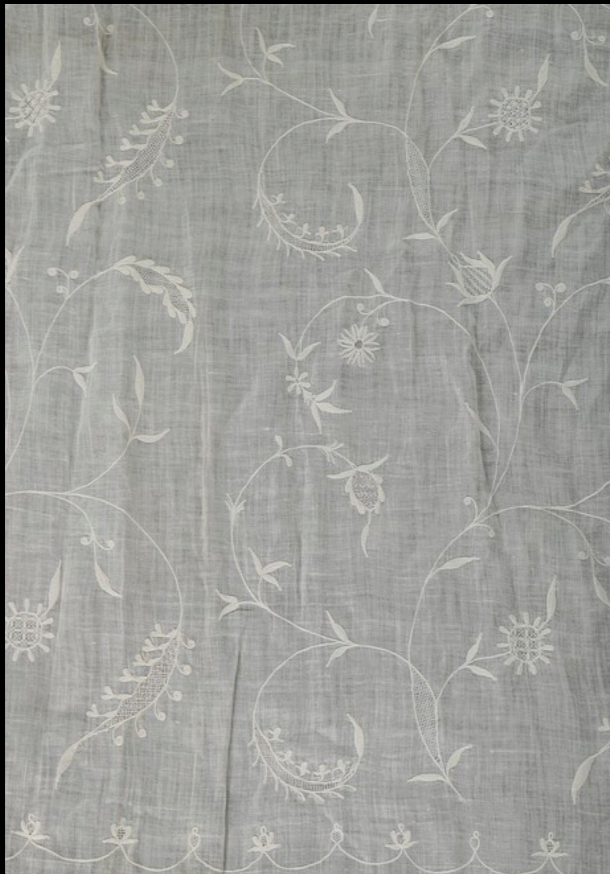
English Muslin Tambour Embroidered Apron c. 1770 - 1780