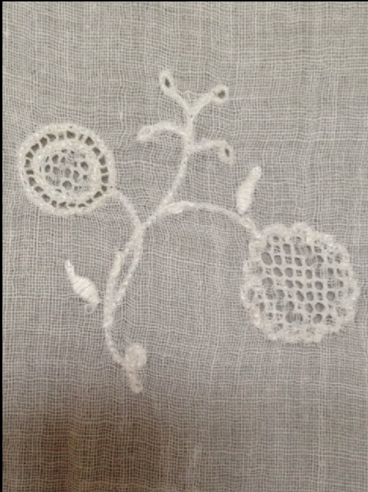
English Muslin Tambour Embroidered Apron