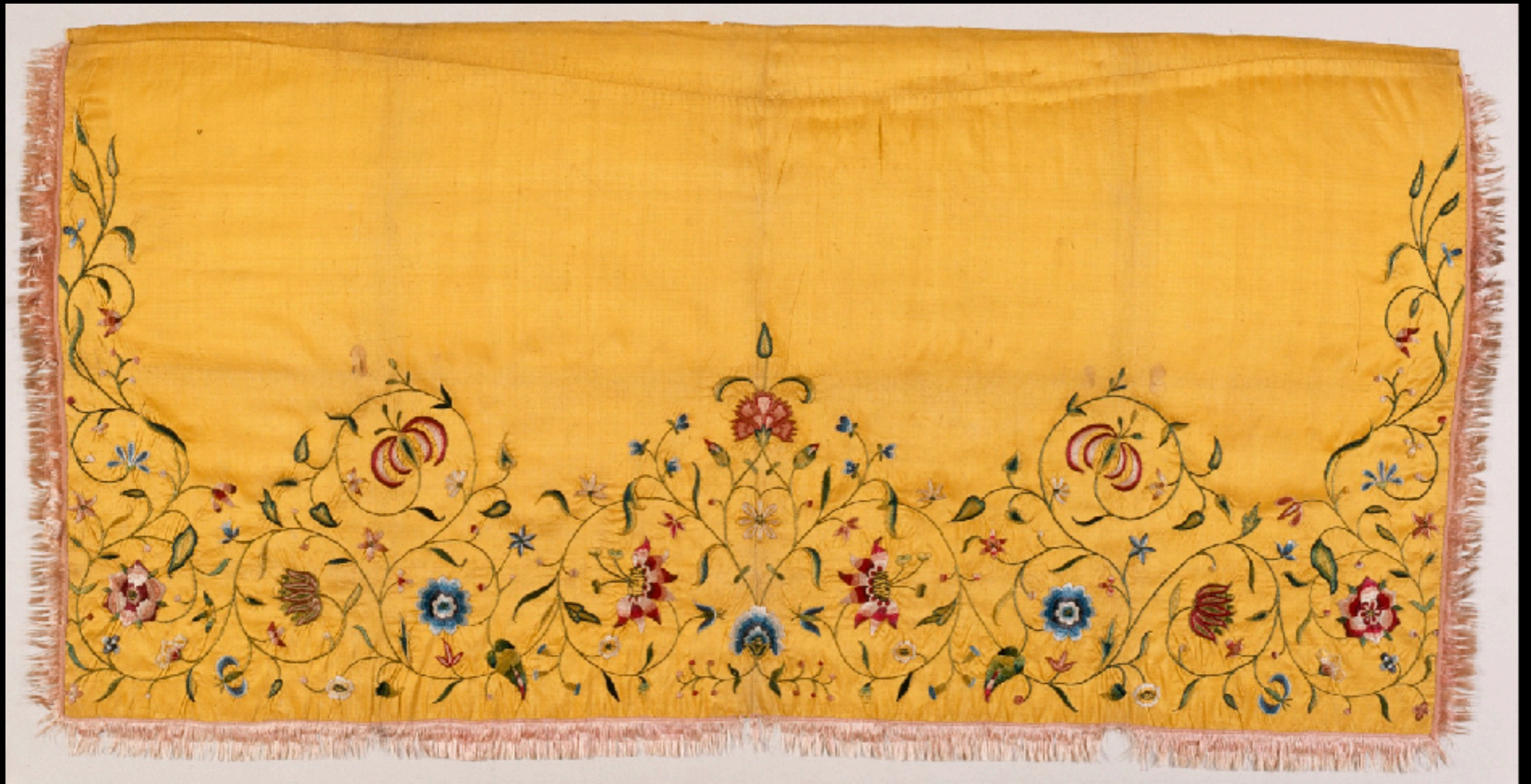
English Embroidered Silk Taffeta Apron c. 1740 (Los Angeles County Museum of Art)