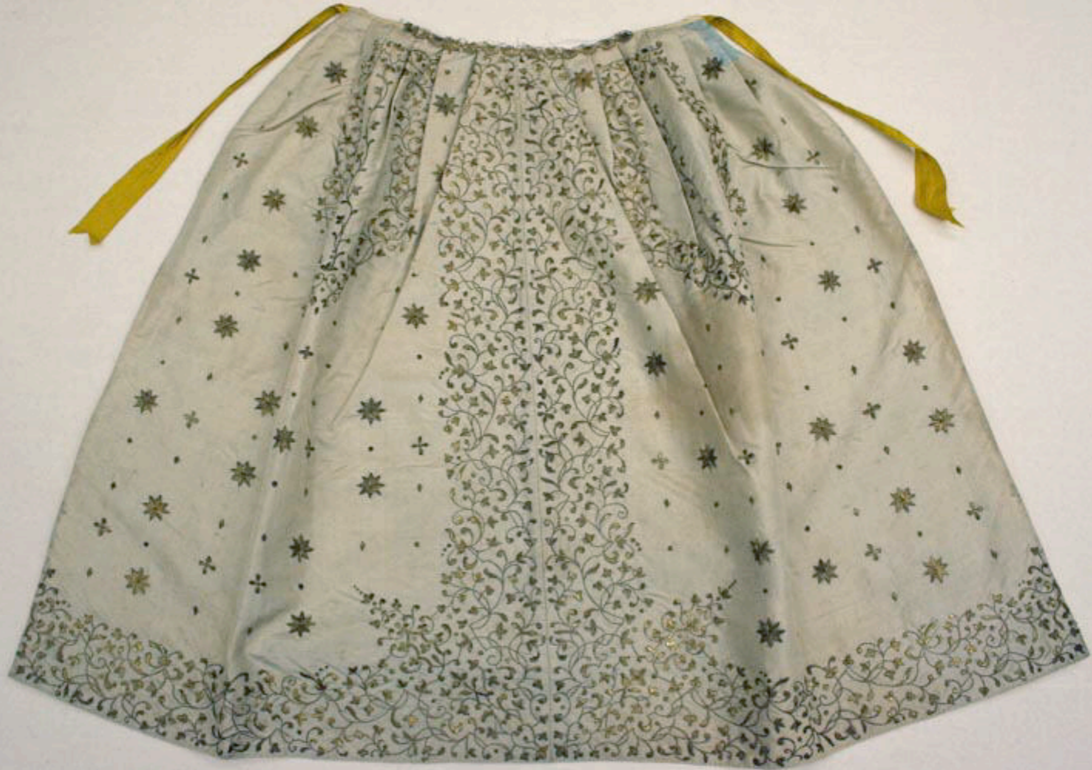
English Silk Apron 18th Century (Metropolitan Museum of Art)