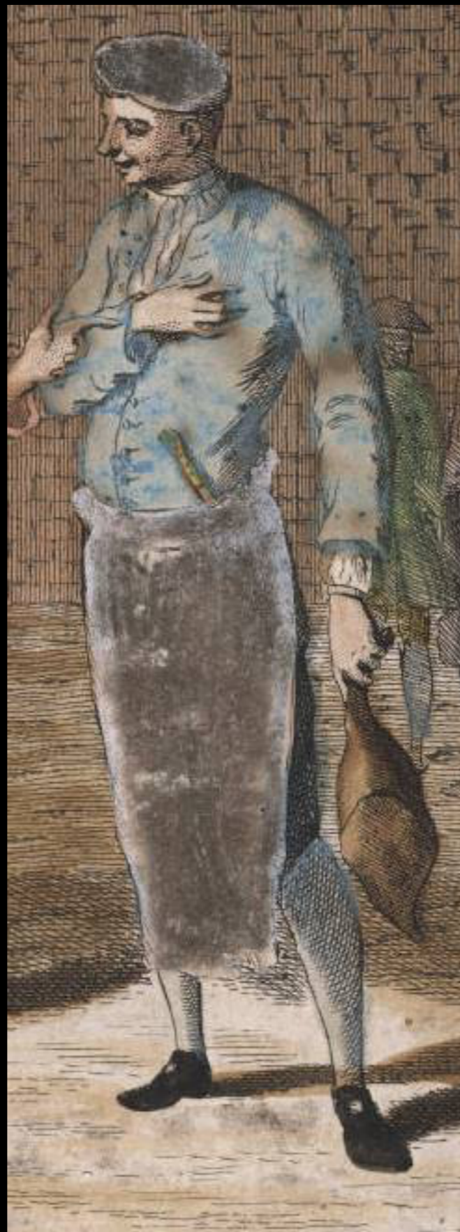
Detail of a Butcher in "THE HUMOURS OF THE FLEET" by Carington Bowles c. 1764