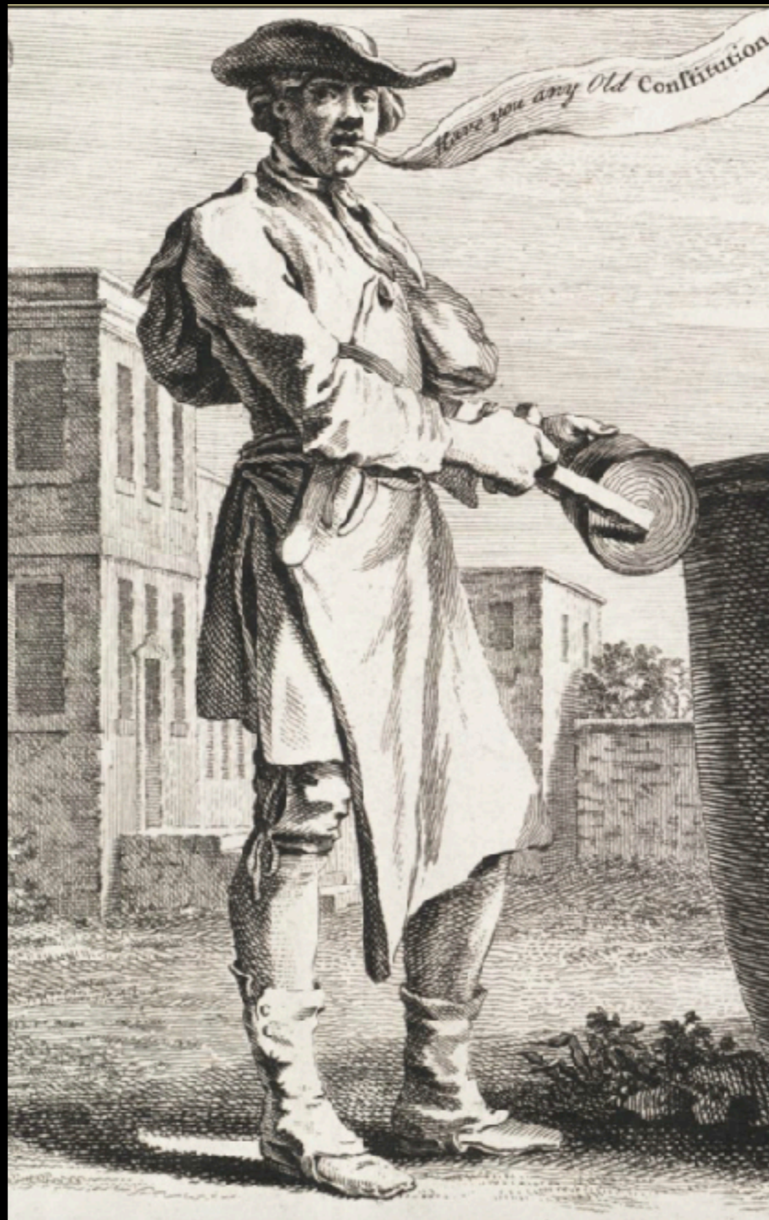
Detail: "The itinerant handy craftsman, or, Caleb turn'd tinker" by Hubert Franc Gravelot, London c. 1740