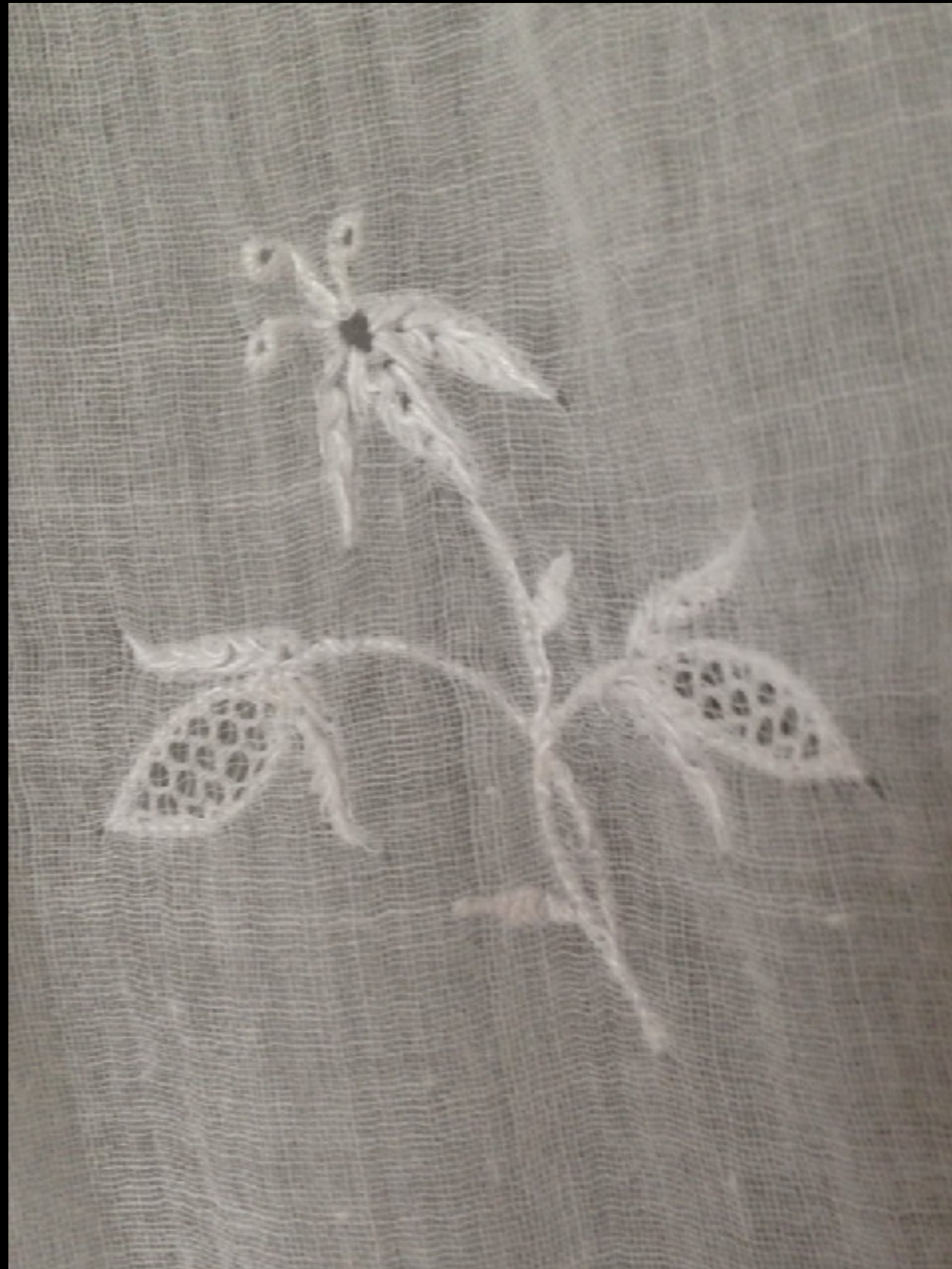
English Muslin Tambour Embroidered Apron