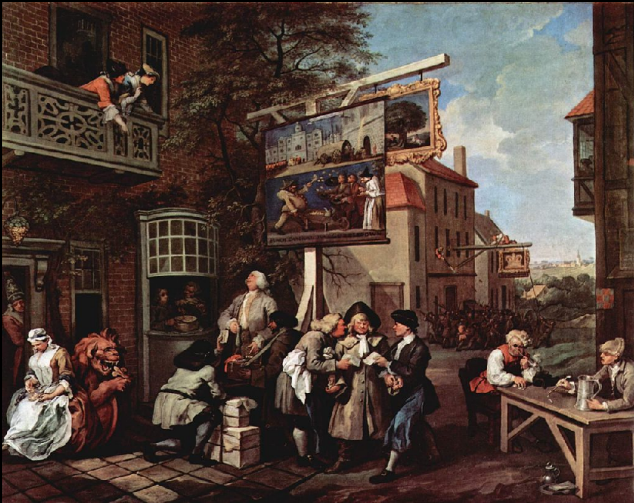
The Humours of an Election Series: "Canvassing for Votes" by William Hogarth c. 1755 (Sir John Soane's Museum, London)