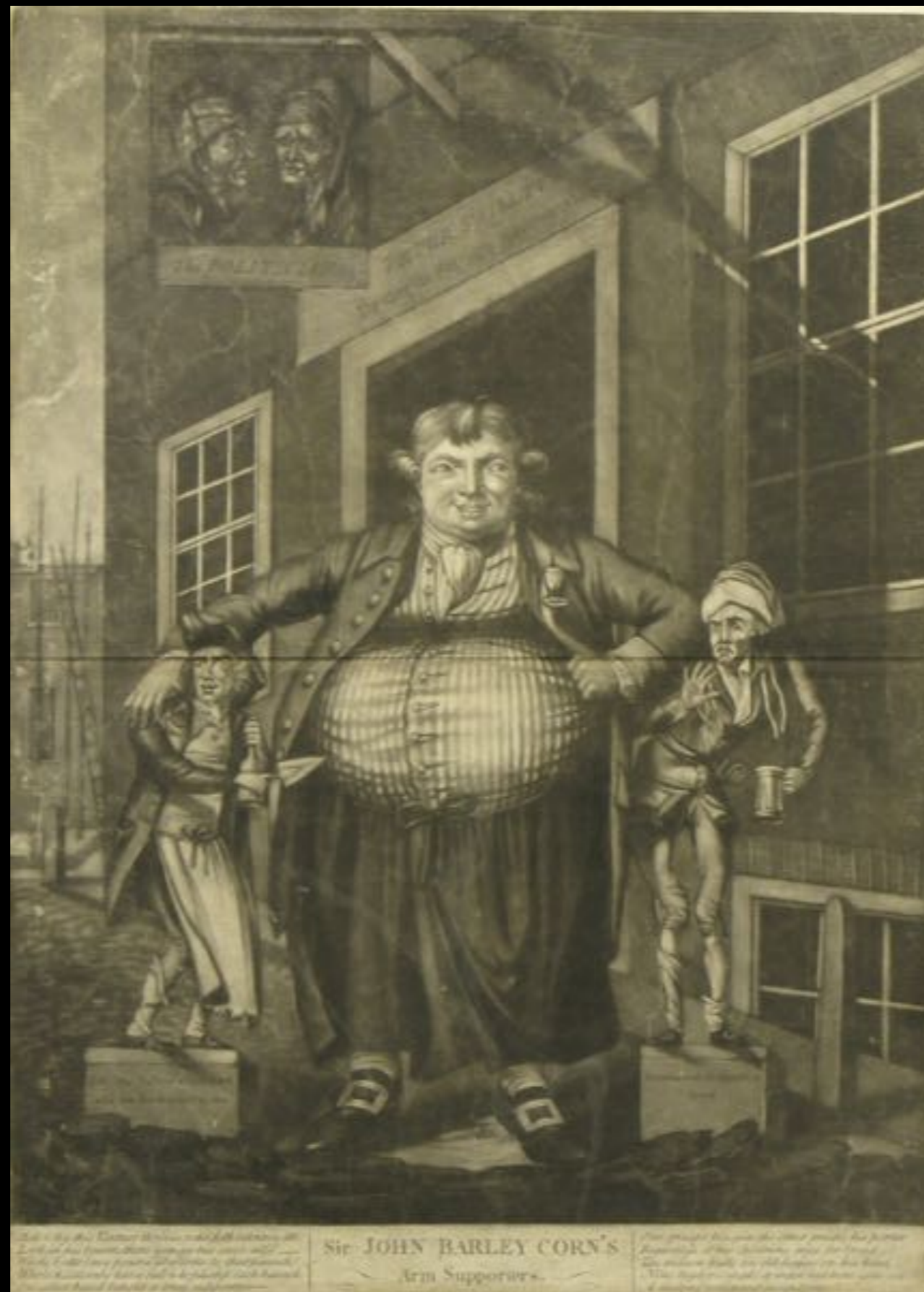
“Sir JOHN BARLEY CORN’s Arm Supporters”