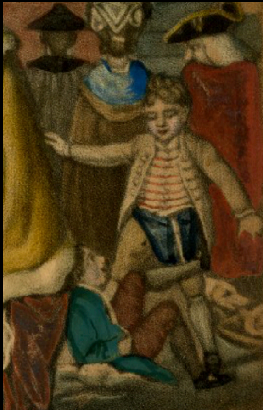
Detail of an Apprentice in "WINTER" by Carington Bowles c. 1779