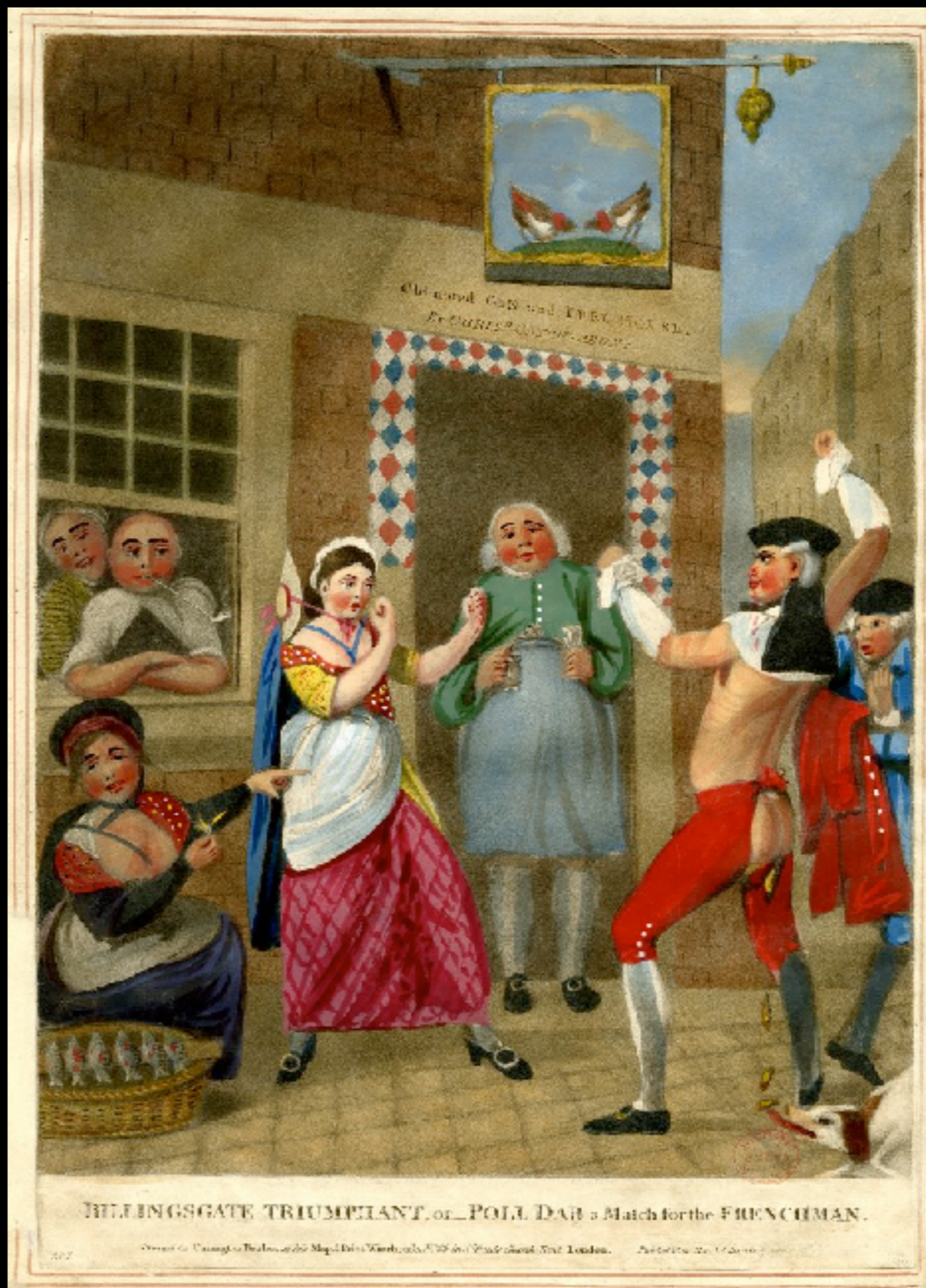
“Billingsgate Triumphant, or - Poll Dab a Match for the Frenchman” by Carington Bowles 1775 (The British Museum)