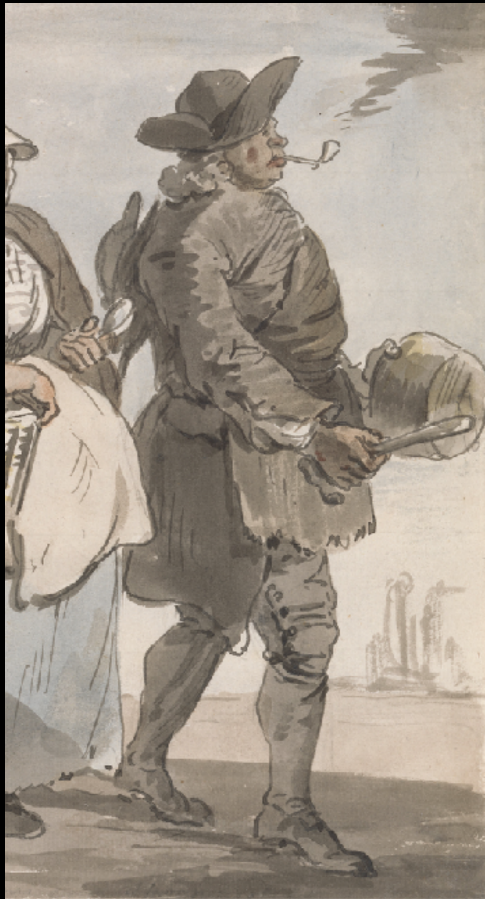
Detail: "Do You Want Any Spoons?" by Paul Sandby "Cries of London" c. 1759