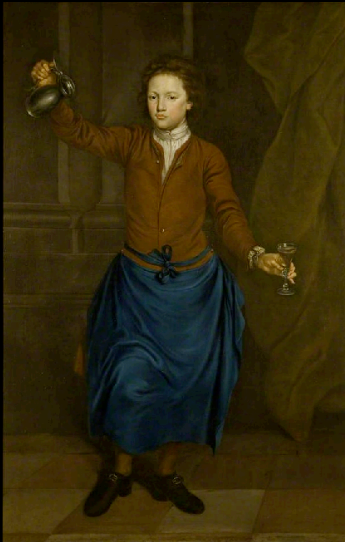
The Pot-Boy by British School c. 1720 (The British Museum)