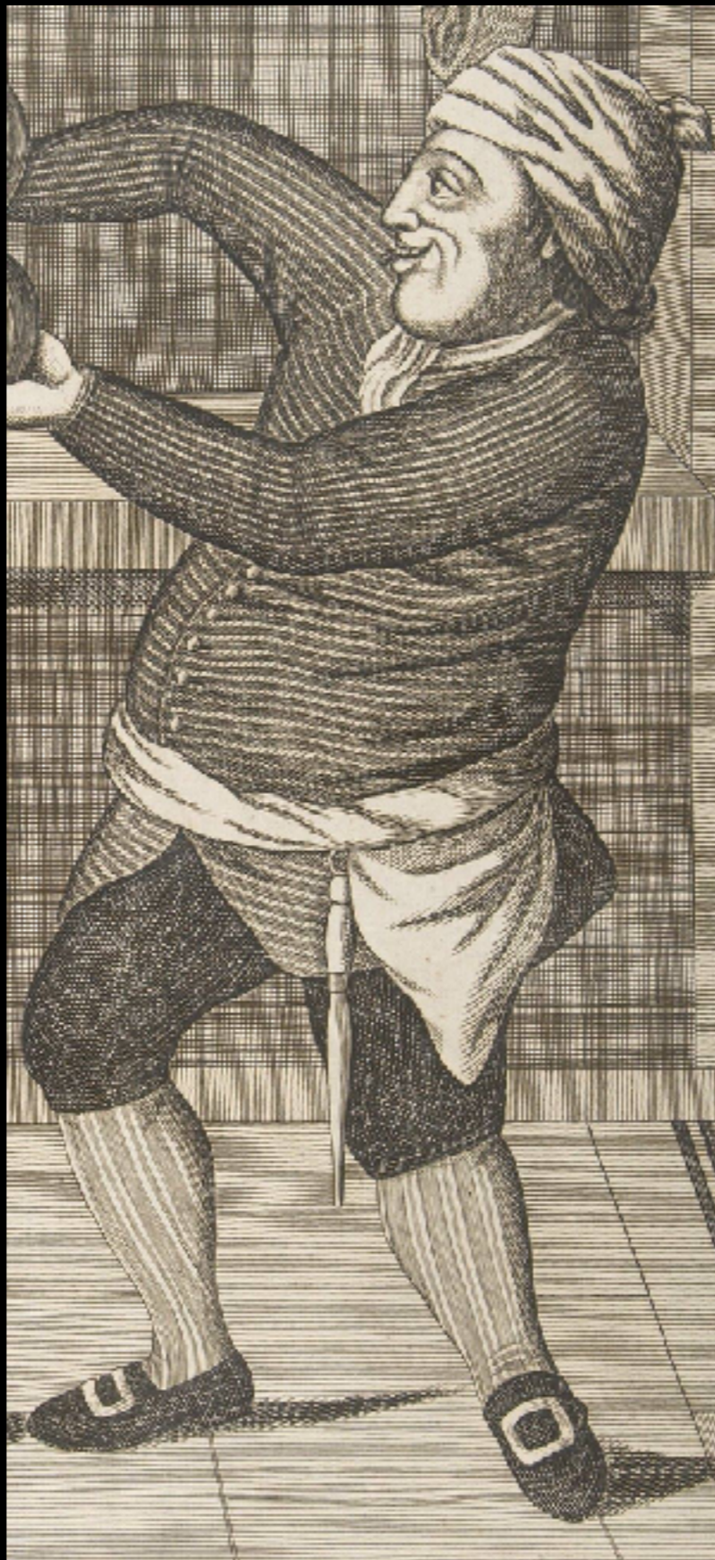
Detail of a Butcher in “DOCKING the MACARONI or the BUTCHER’S REVENGE” by Carington Bowles c. 1773