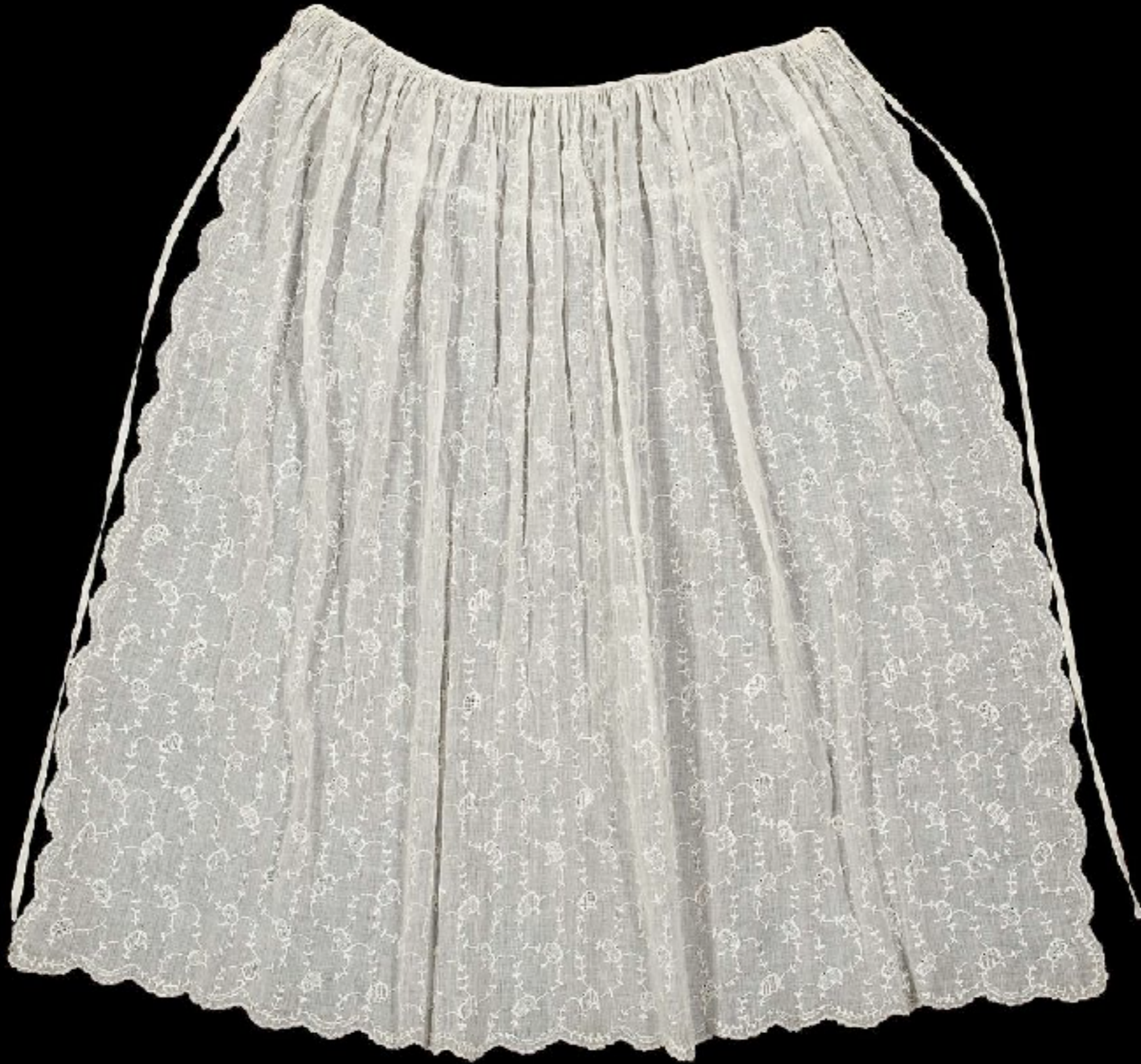
English Linen & Cotton Muslin Apron 18th Century (Museum of Fine Arts, Boston)