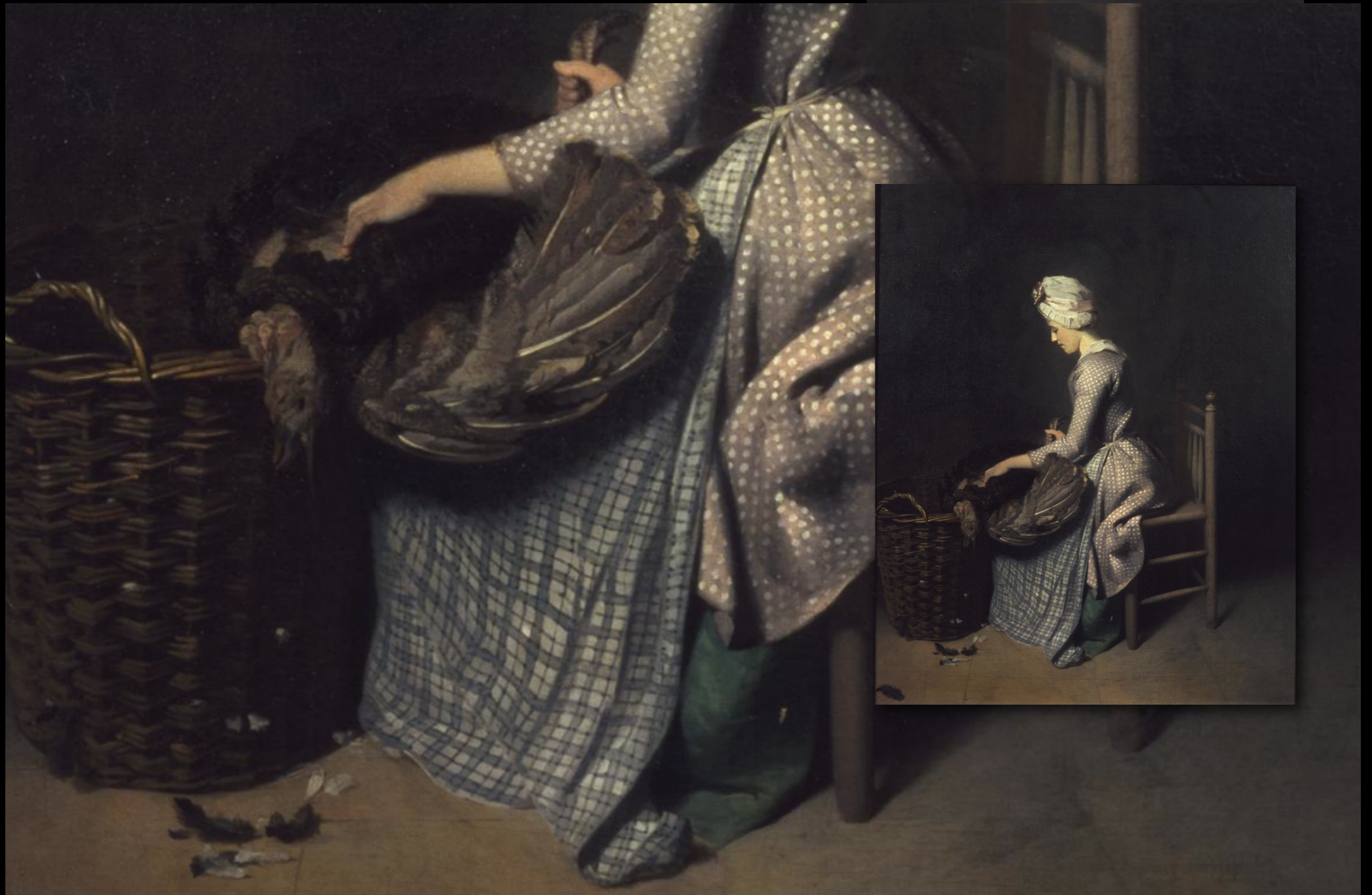
English Checked, Likely Linen, Apron - "Plucking the Turkey" by Henry Walton 1776