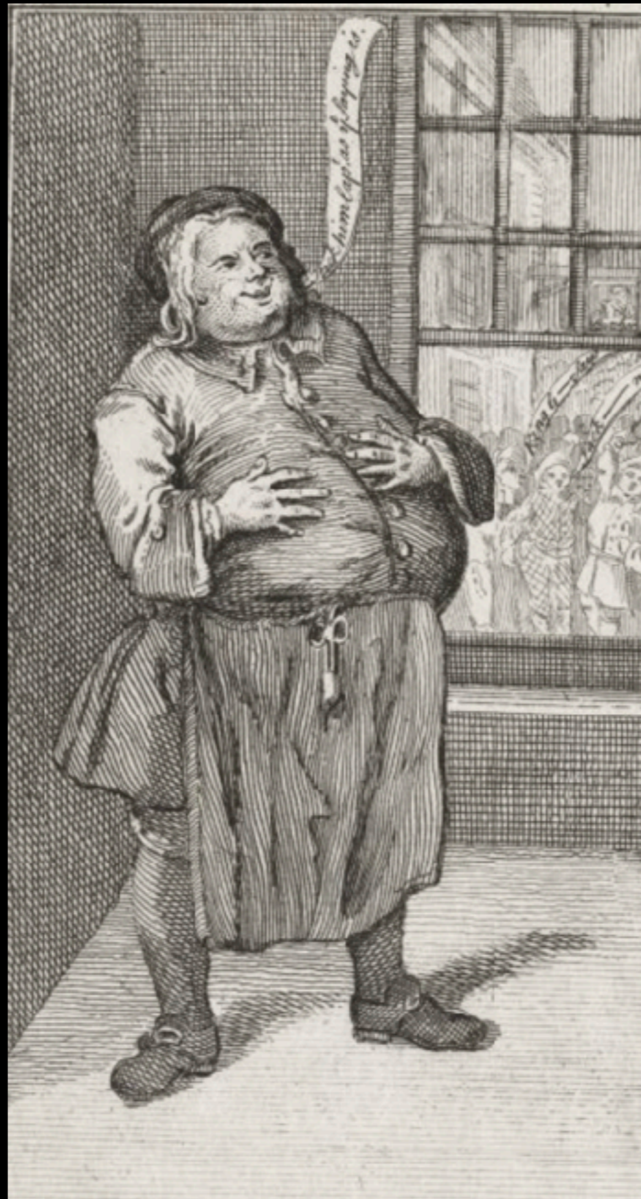
Detail of a Butcher in "The Bellman and the Captain" London c. 1749