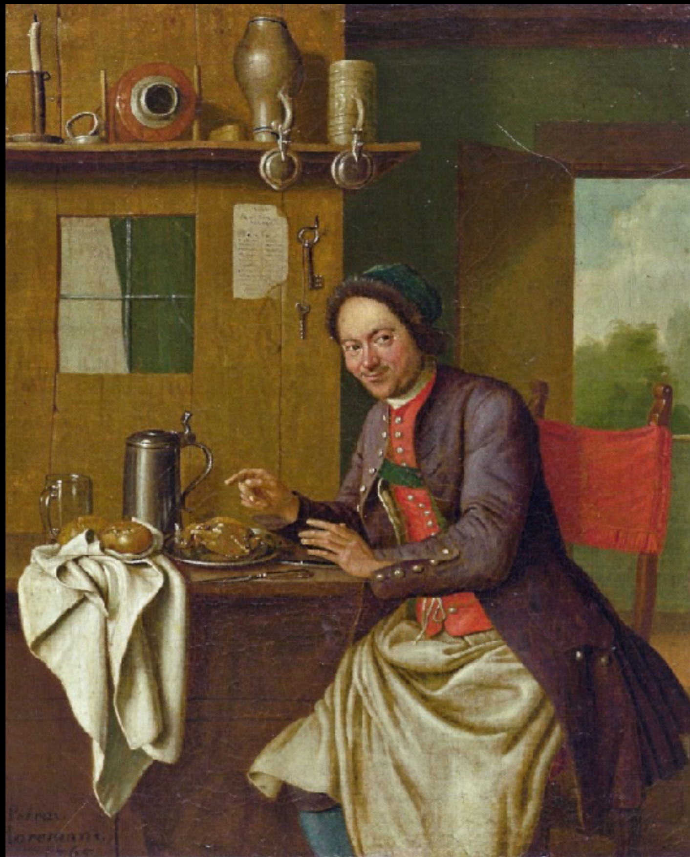
Portrait of a Host by Peter Jakob Horemans 1765