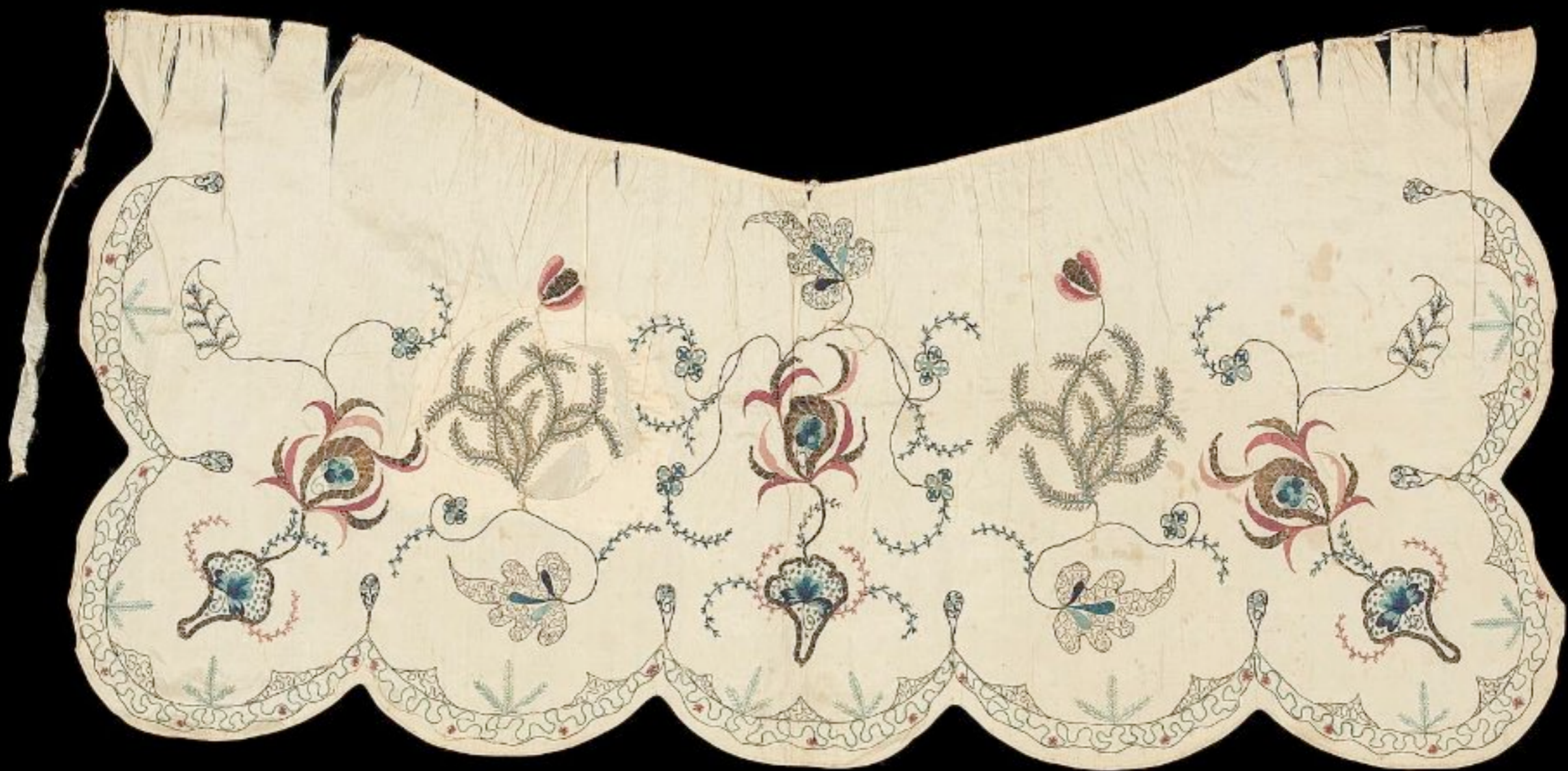
New England Silk Apron 18th Century (Museum of Fine Arts, Boston)