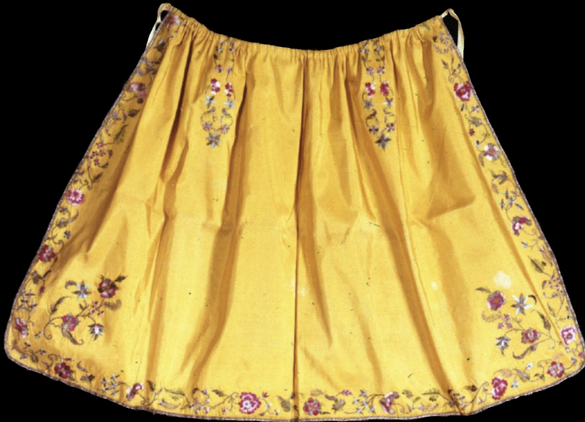
English Embroidered Silk Apron