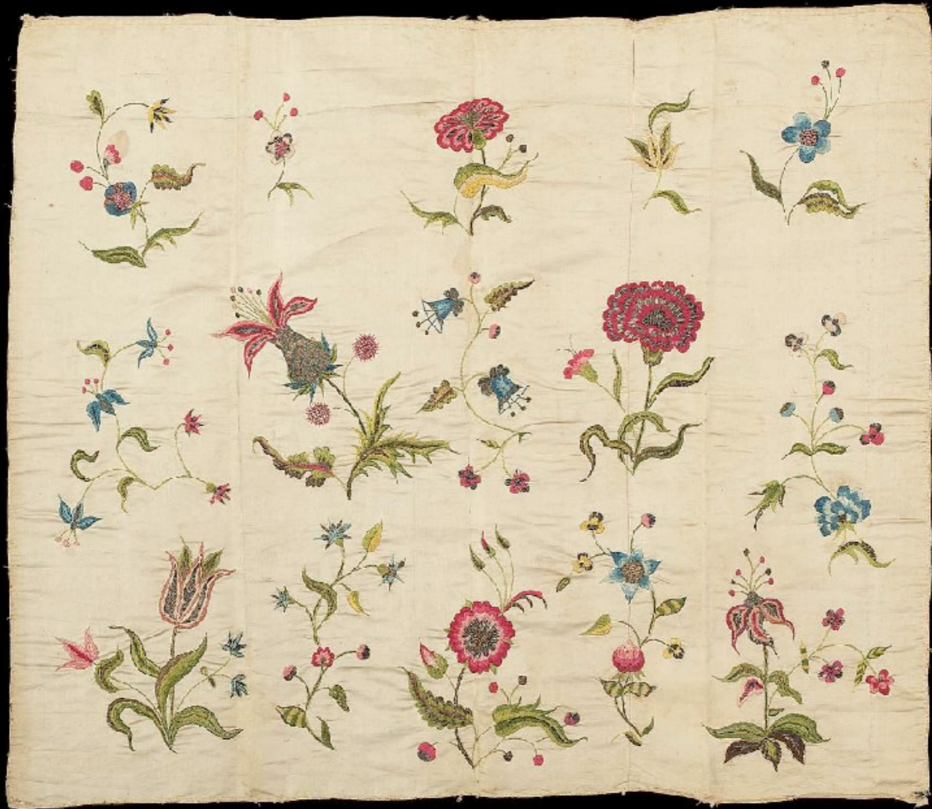
New England Silk Apron c. 1725 - 1750 (Museum of Fine Arts, Boston)