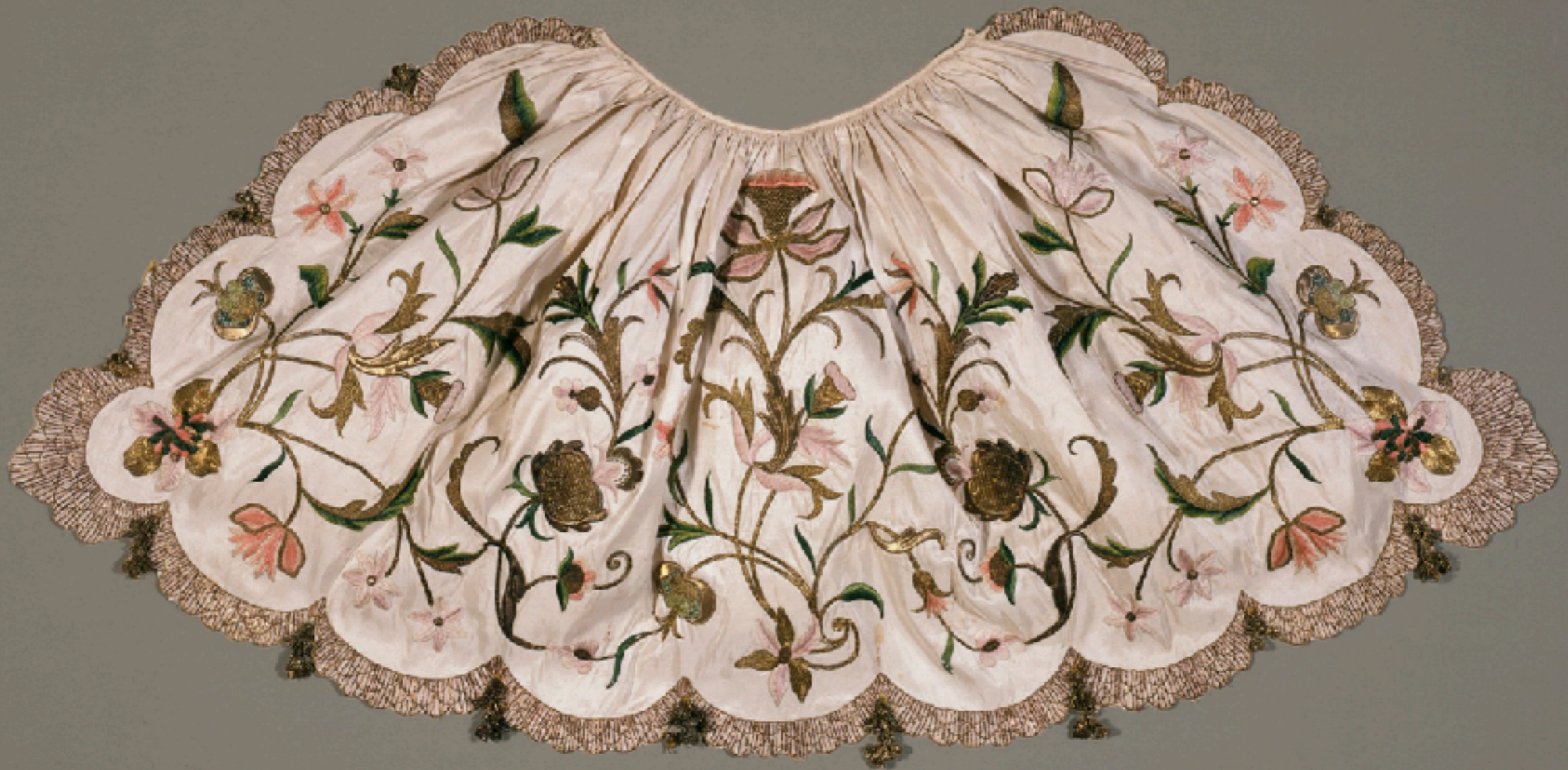
English Embroidered Silk Apron c. 1730 - 1740 (Los Angeles County Museum of Art)