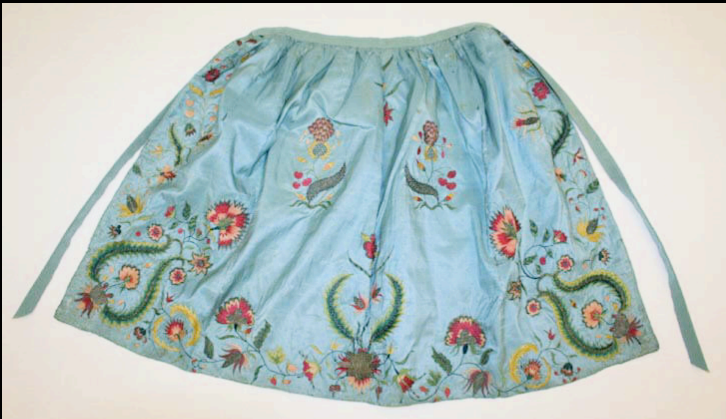
English Metal Embroidered Silk Apron Early 18th Century (Metropolitan Museum of Art)