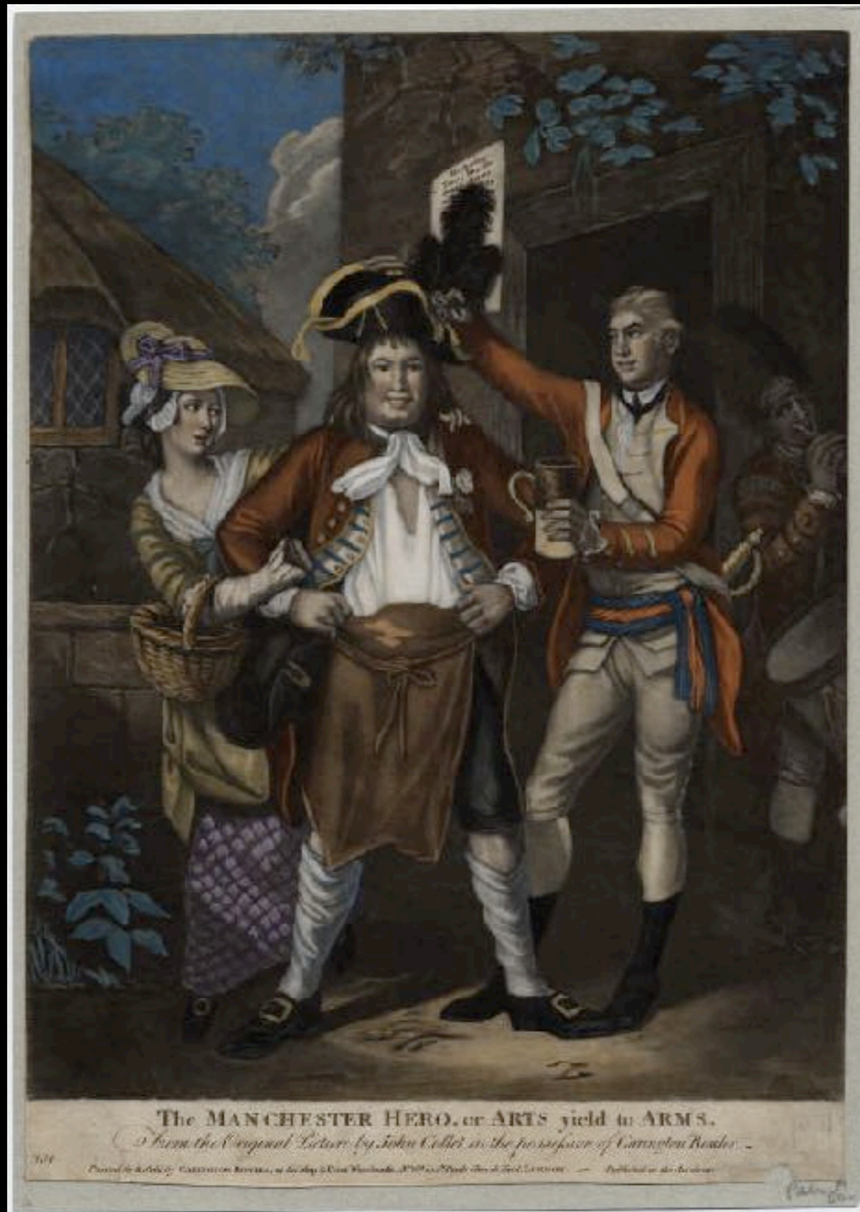
“THE MANCHESTER HERO, or ARTS yield to ARMS” by Carington Bowles (Private Collection)