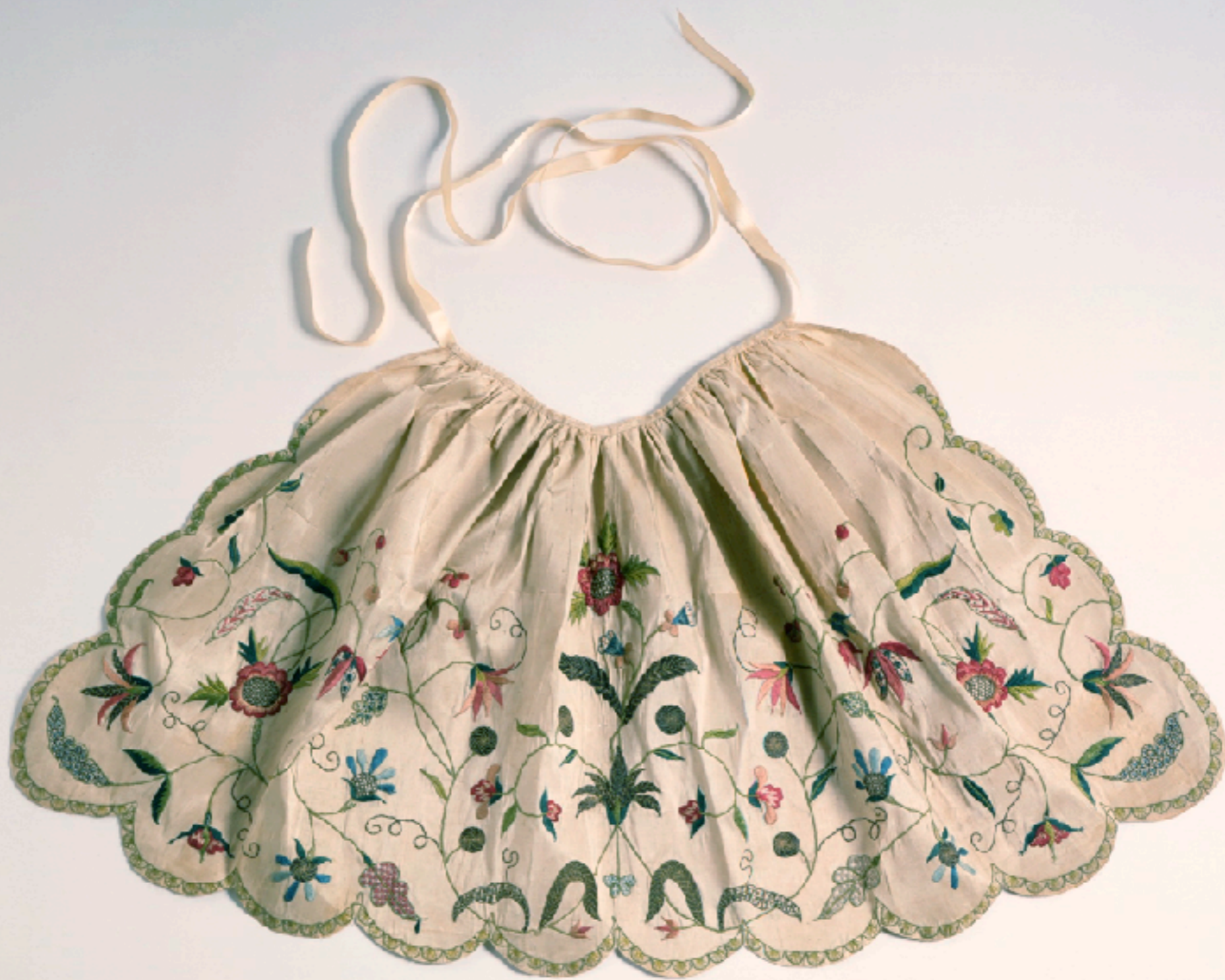
English Embroidered Silk Taffeta Apron c. 1740 (Los Angeles County Museum of Art)