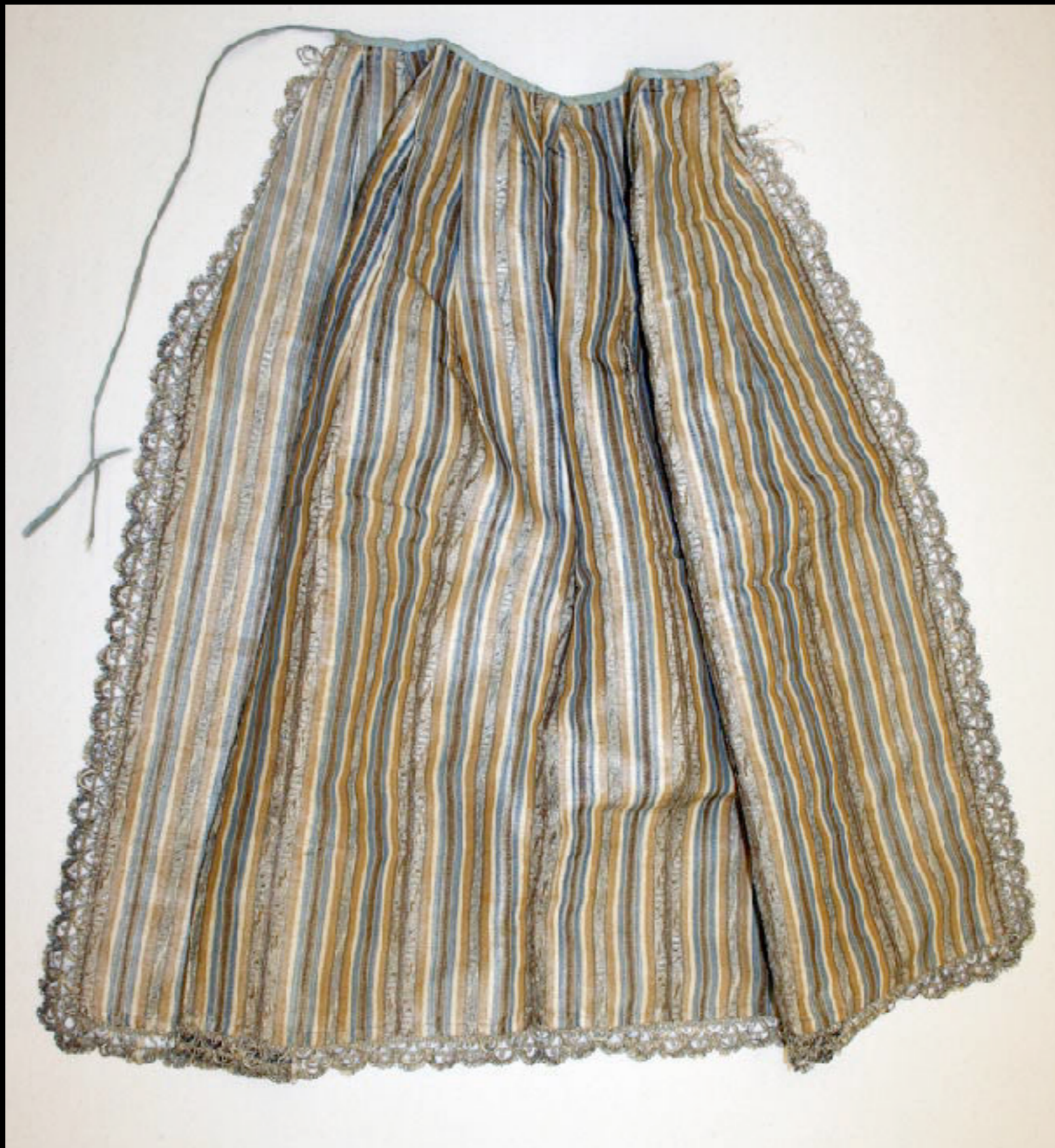
English Metal Embroidered Silk Apron c. 1700 - 1735 (Metropolitan Museum of Art)