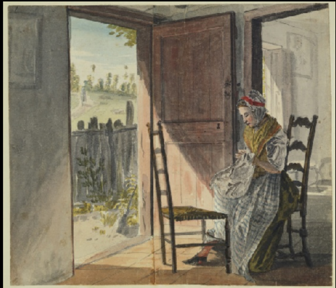
English Checked, Likely Linen, Apron - "At Sandpit Gate" by Paul Sandby 1758 (The Royal Collection - Courtesy Wm. Booth, Draper)