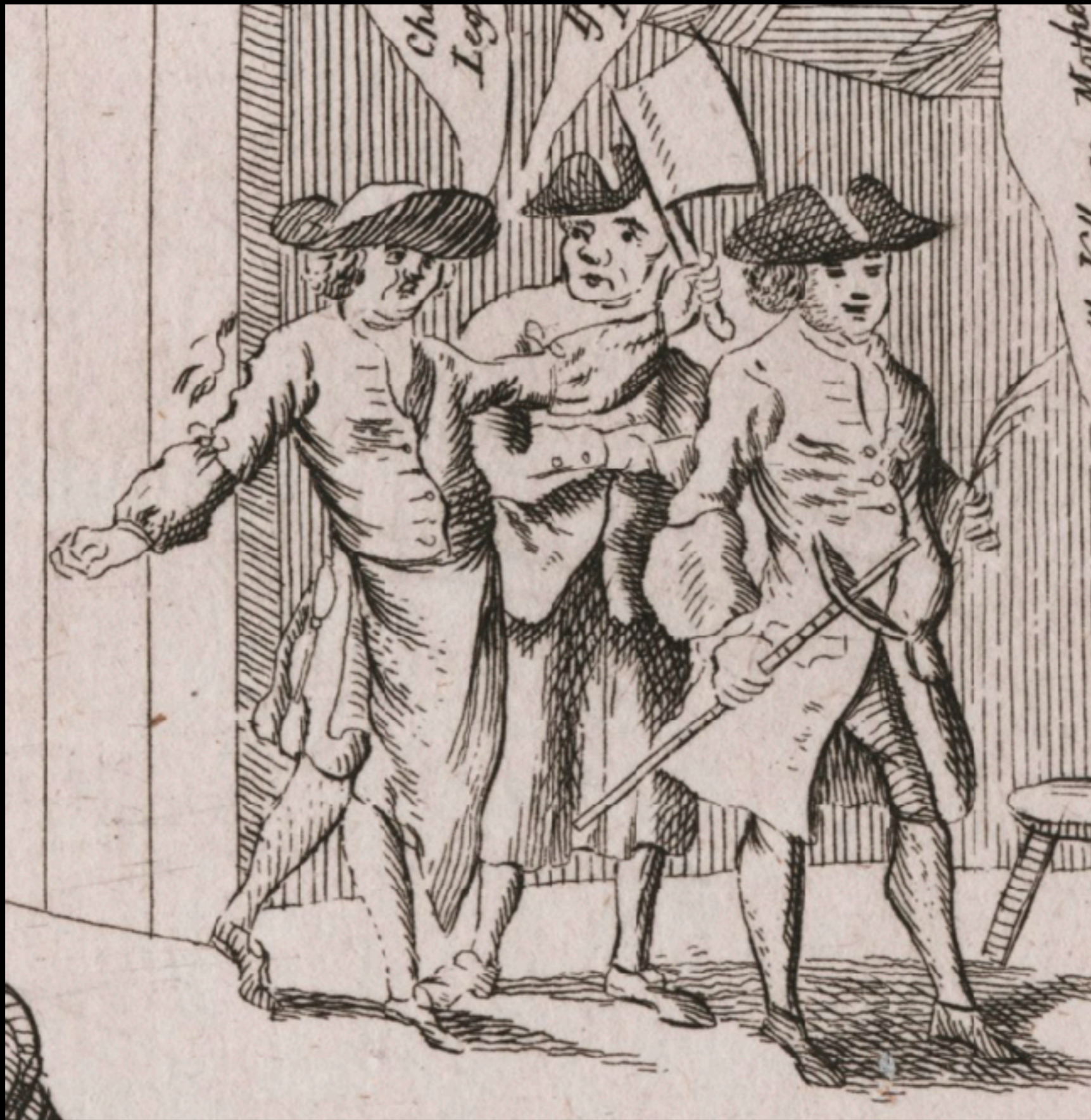
Detail: "Oppression Display'd"