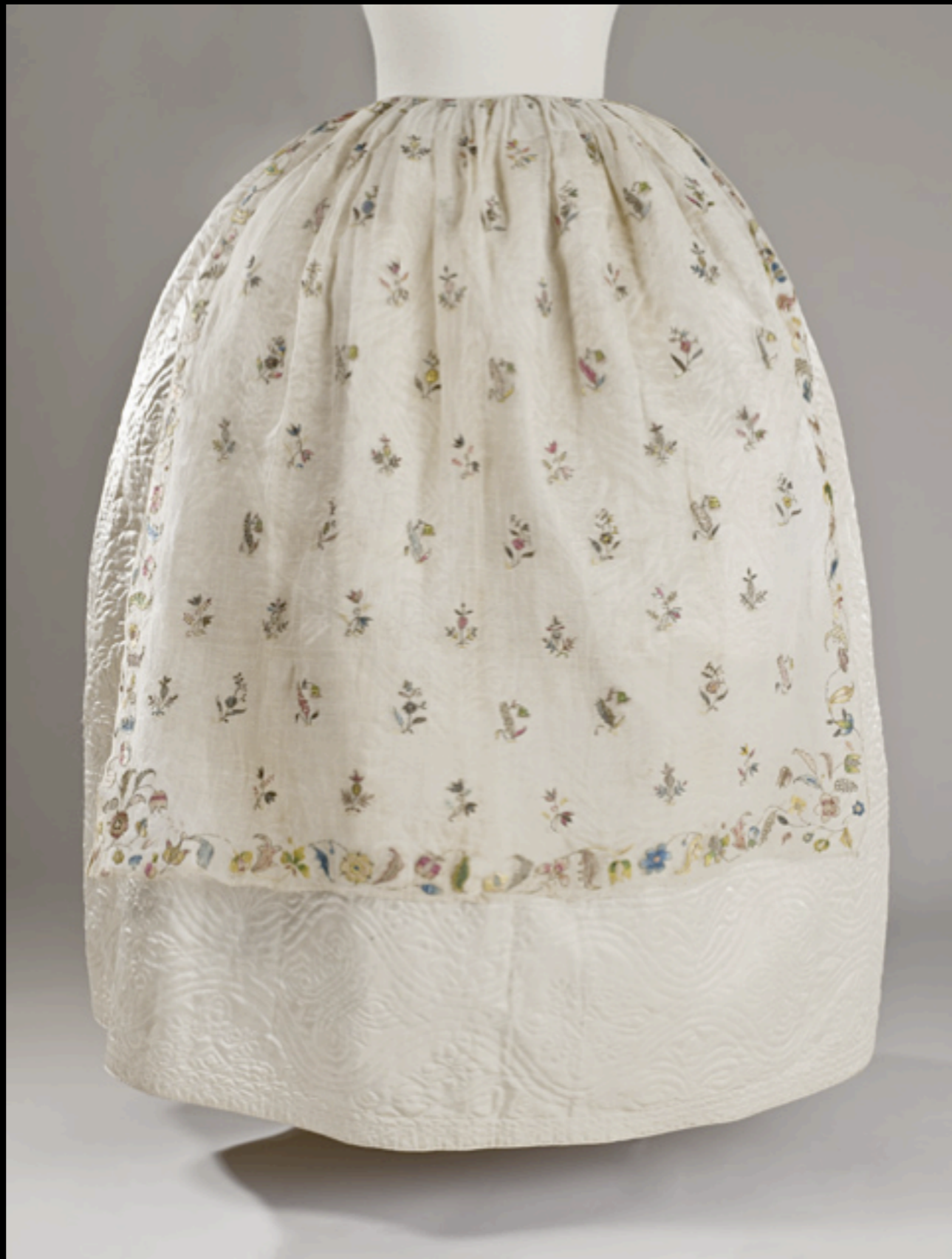
English Embroidered Cotton Apron c. 1750 - 1780 (Los Angeles County Museum of Art)