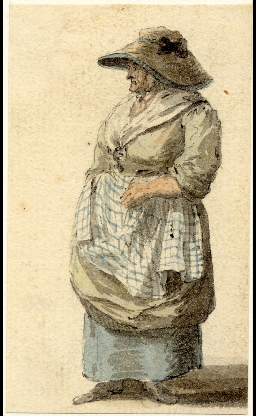
English Checked, Likely Linen, Apron - "Market Woman" by Paul Sandby c. 1748 - 1760