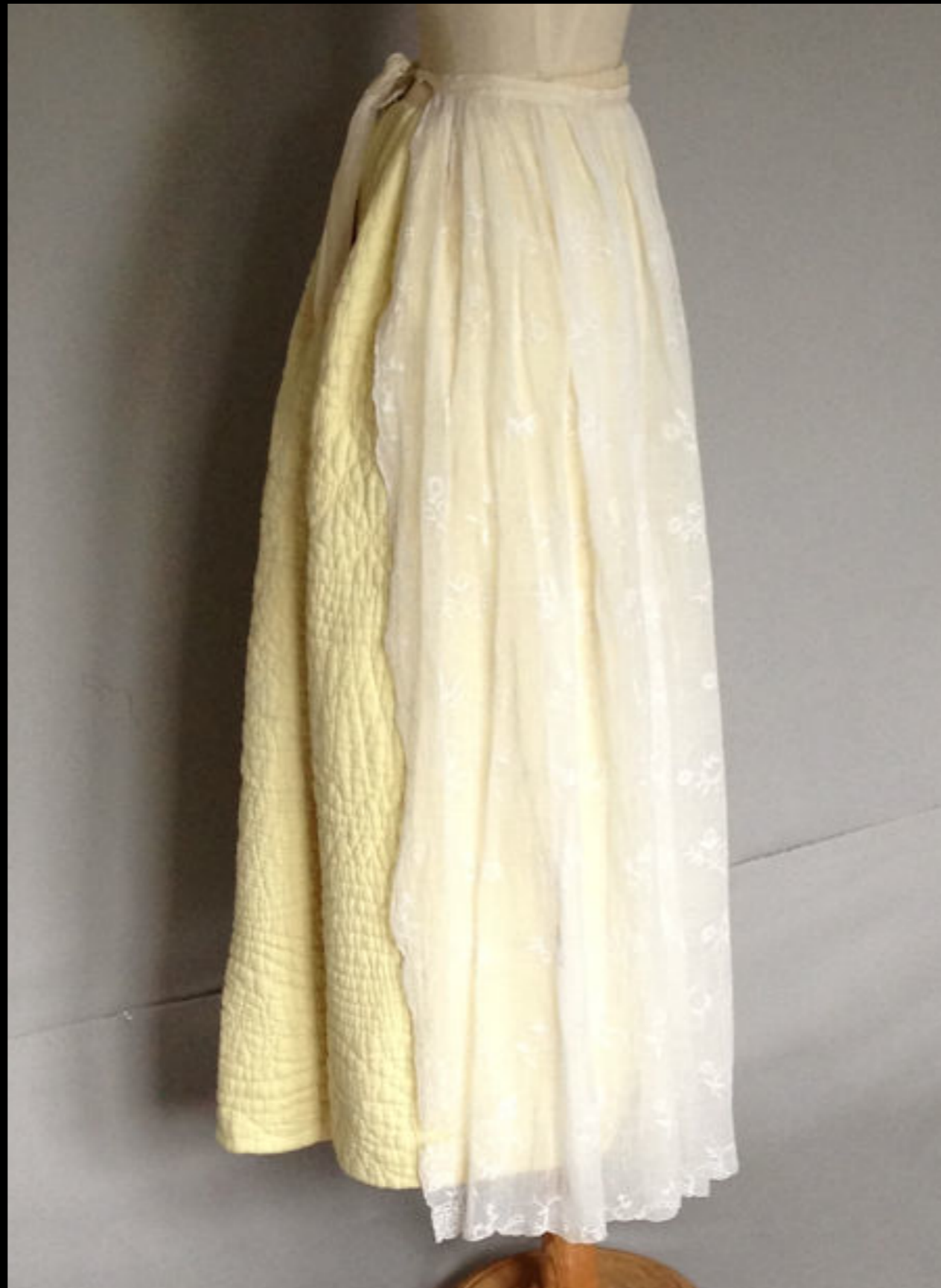
English Muslin Tambour Embroidered Apron