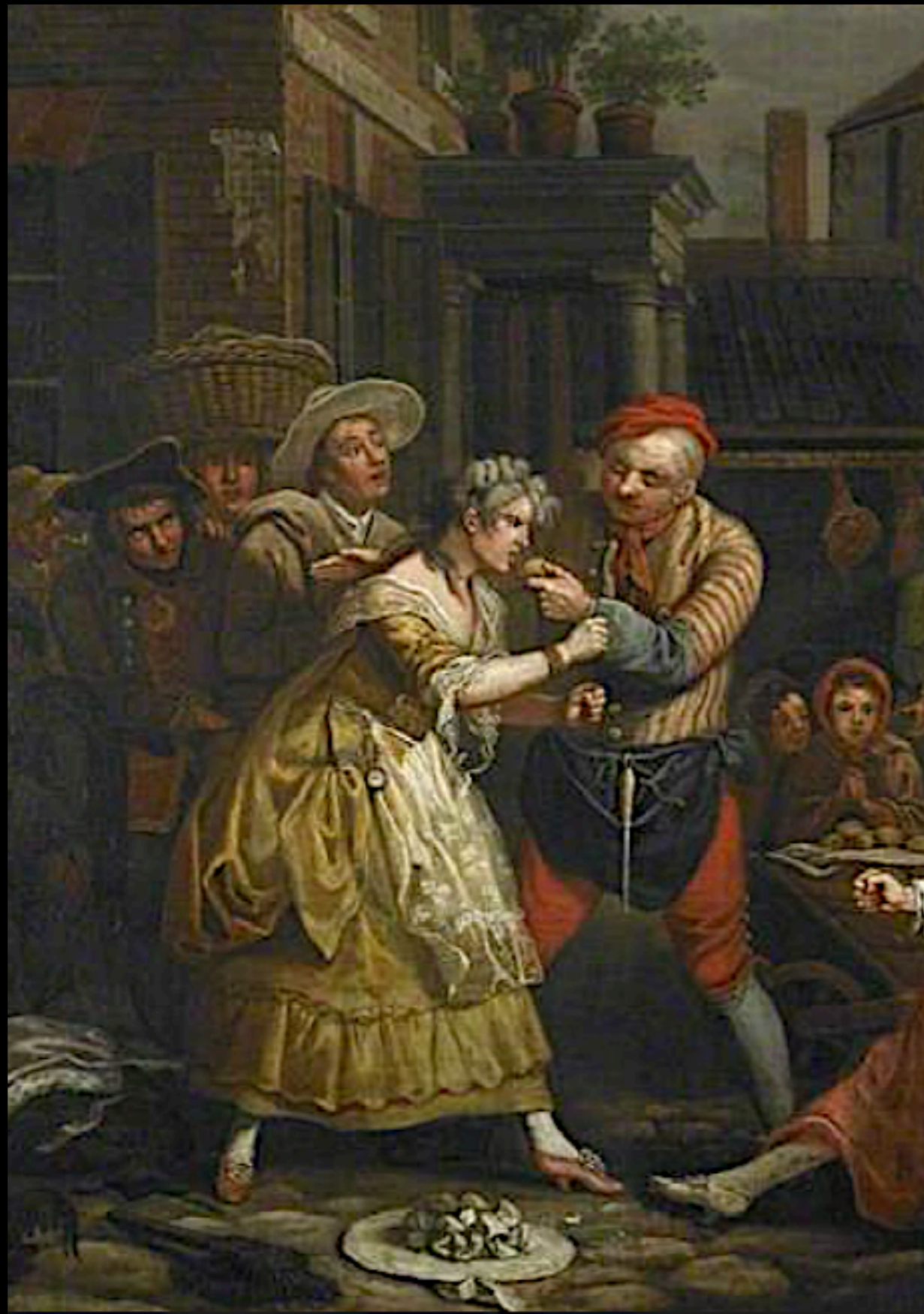
Detail: "The Female Bruisers" by John Collet c. 1770