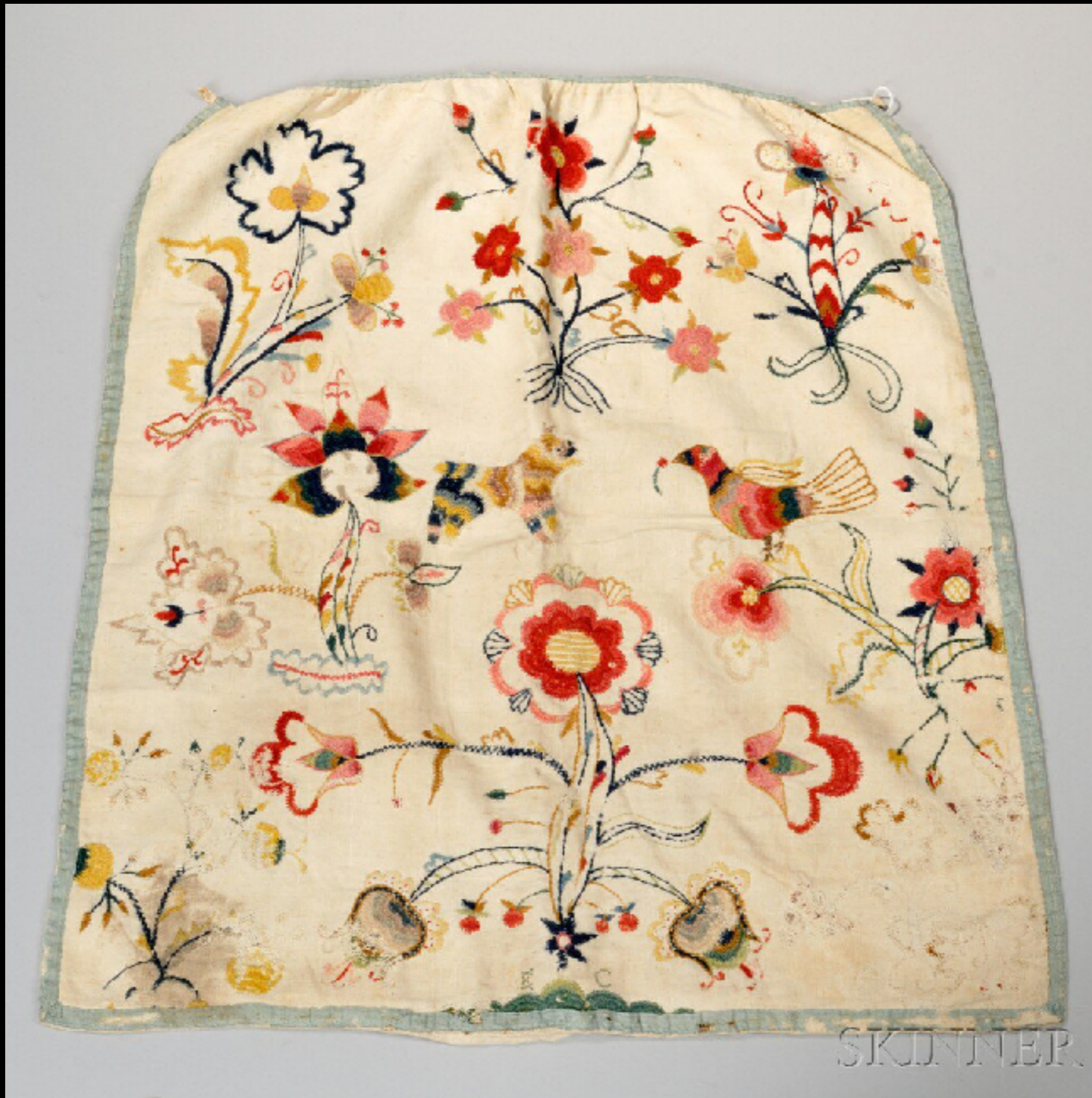
Crewelwork Apron 18th Century (Skinner)