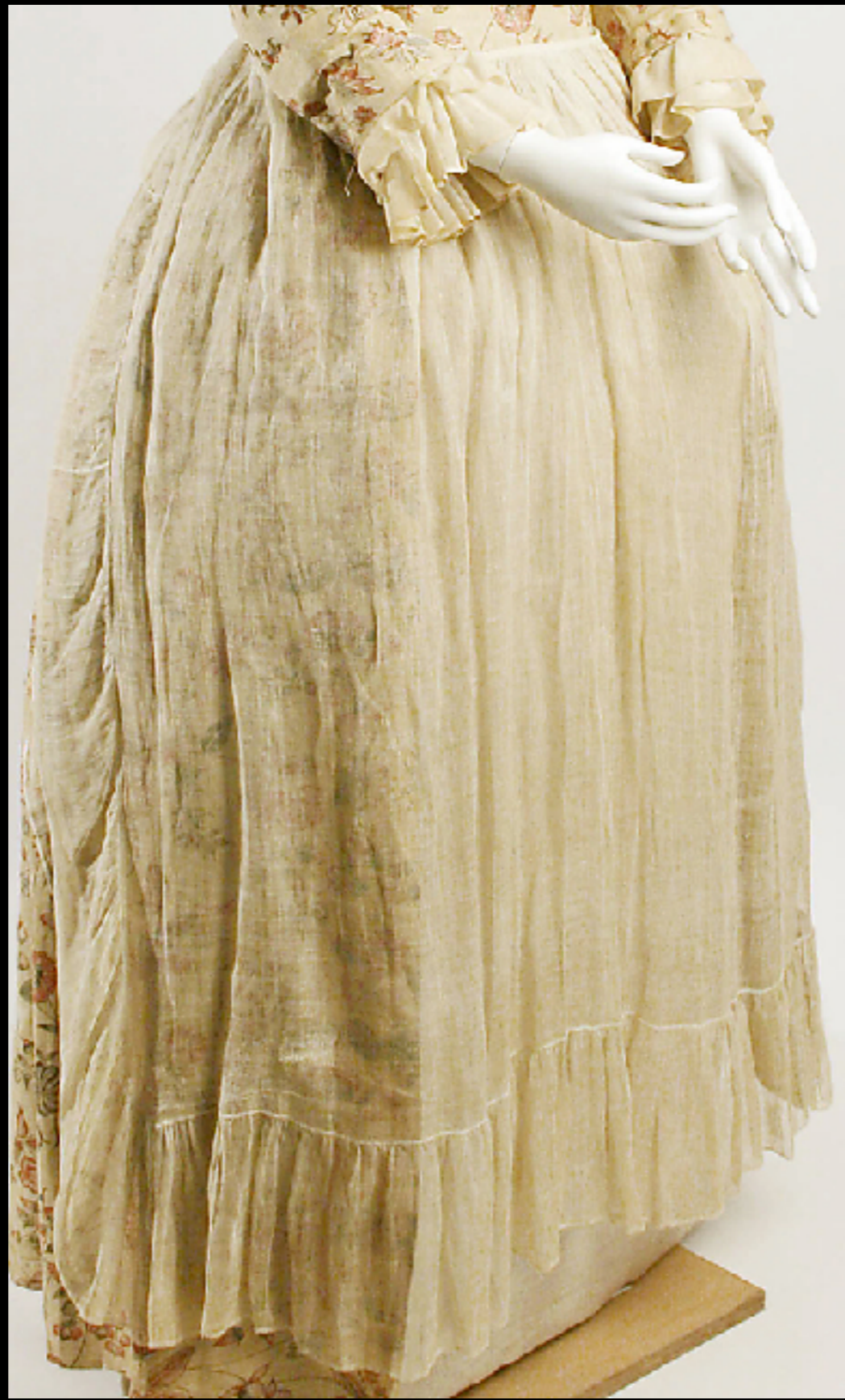
American Linen & Cotton Apron 18th Century (Metropolitan Museum of Art)