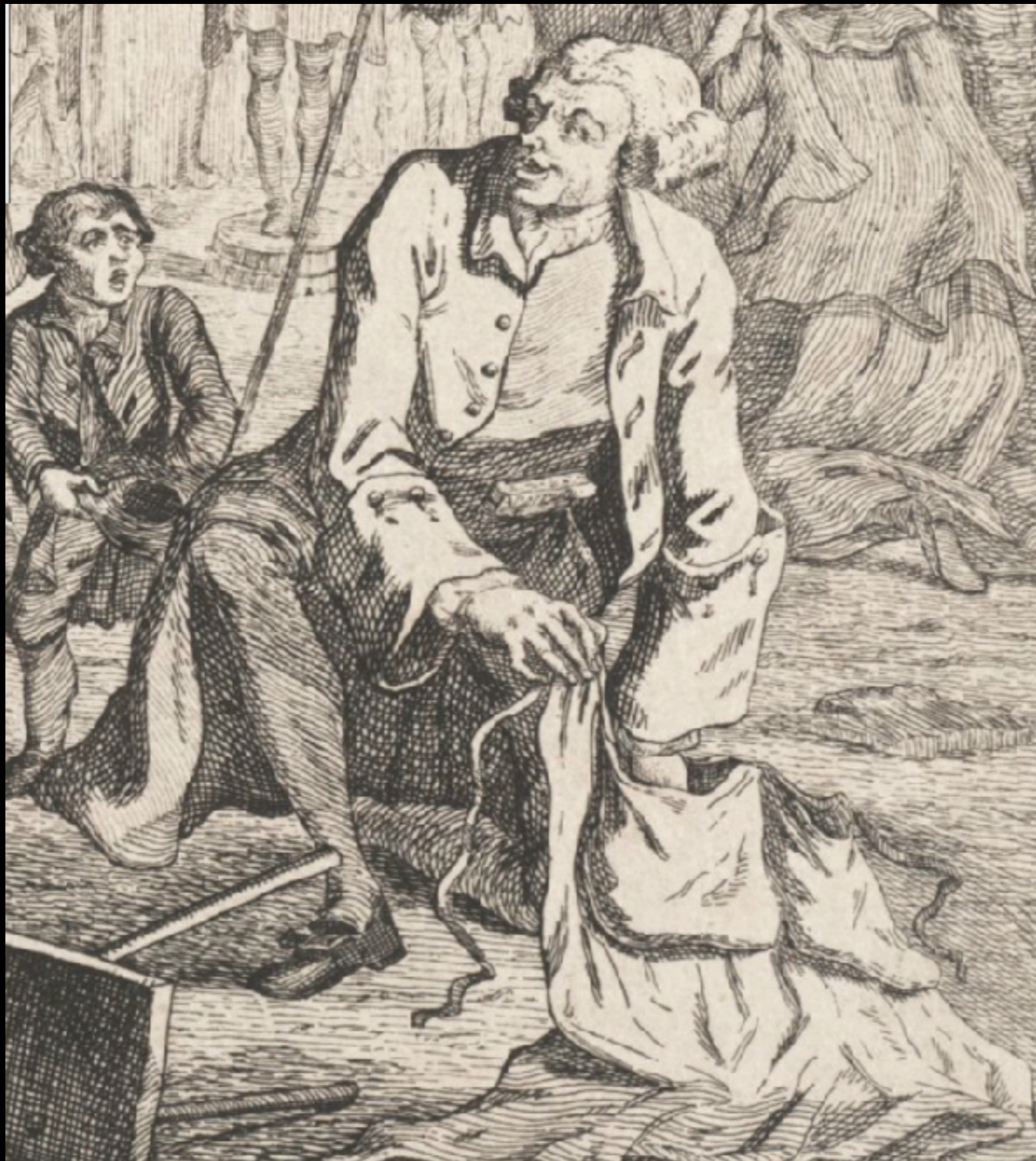
Detail: Pocket Apron From "MODERN REFORMERS"