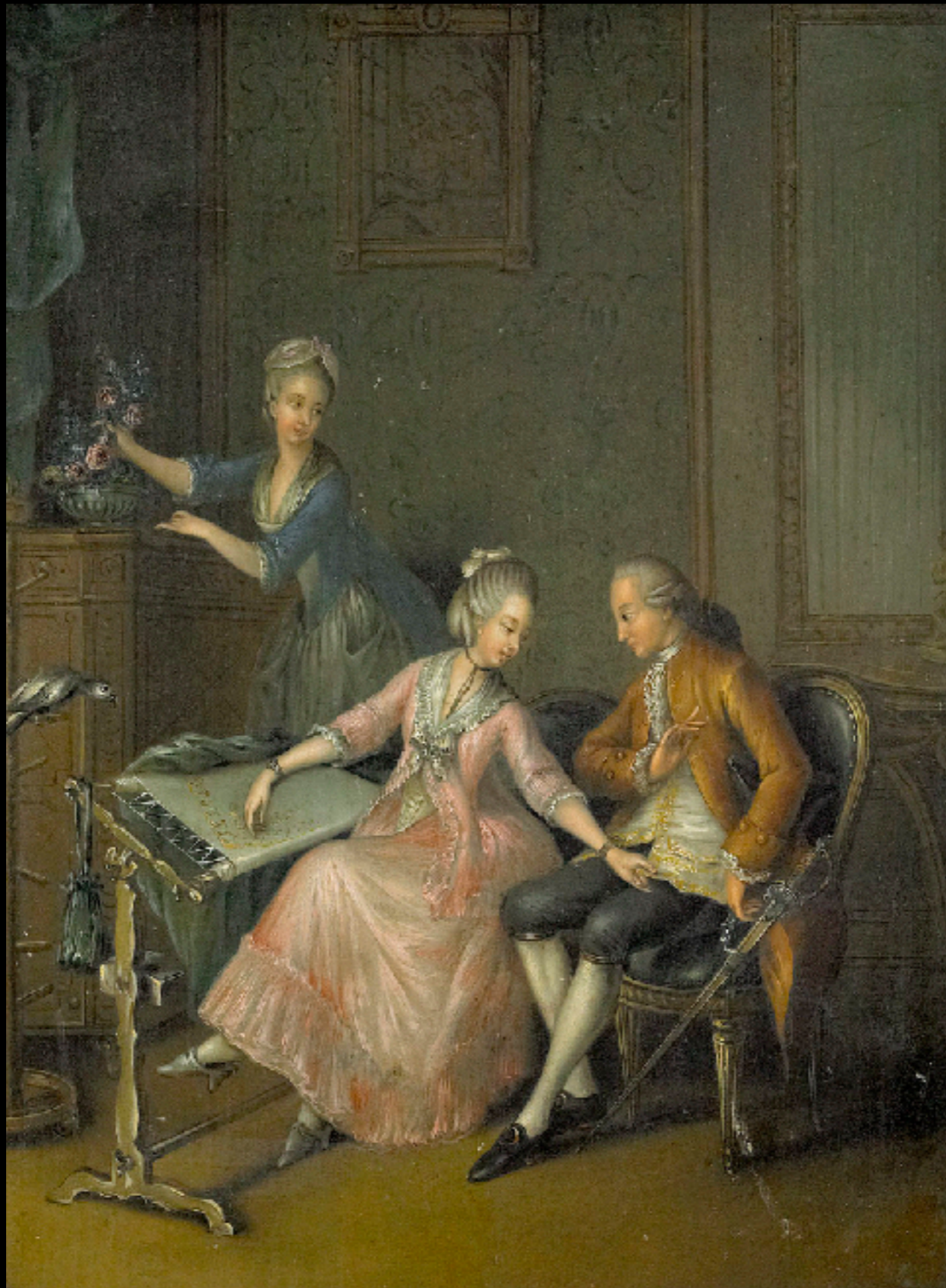
Detail: Pocket Apron From "An Elegant Interior" by Nicolas Lafrensen 1780