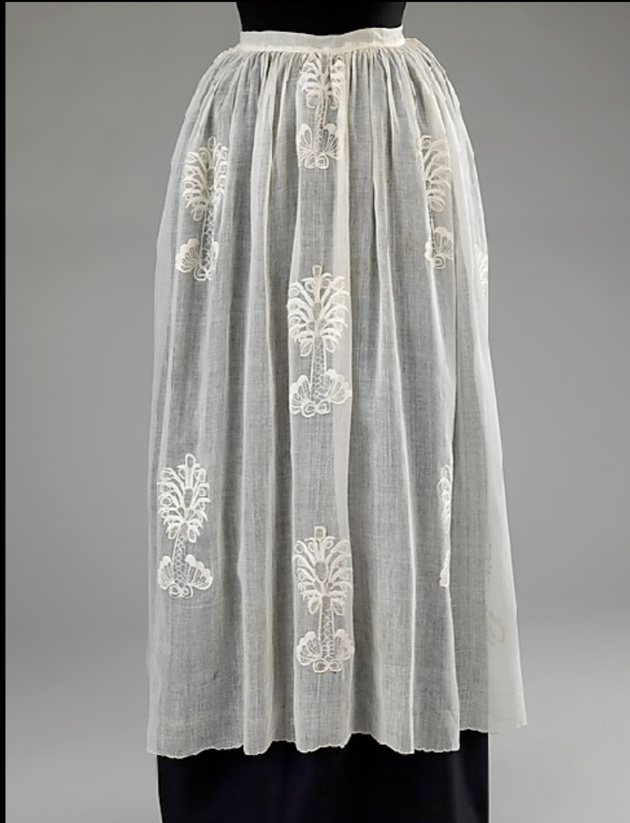
English Cotton Apron c. 1760 - 1770 (Metropolitan Museum of Art)