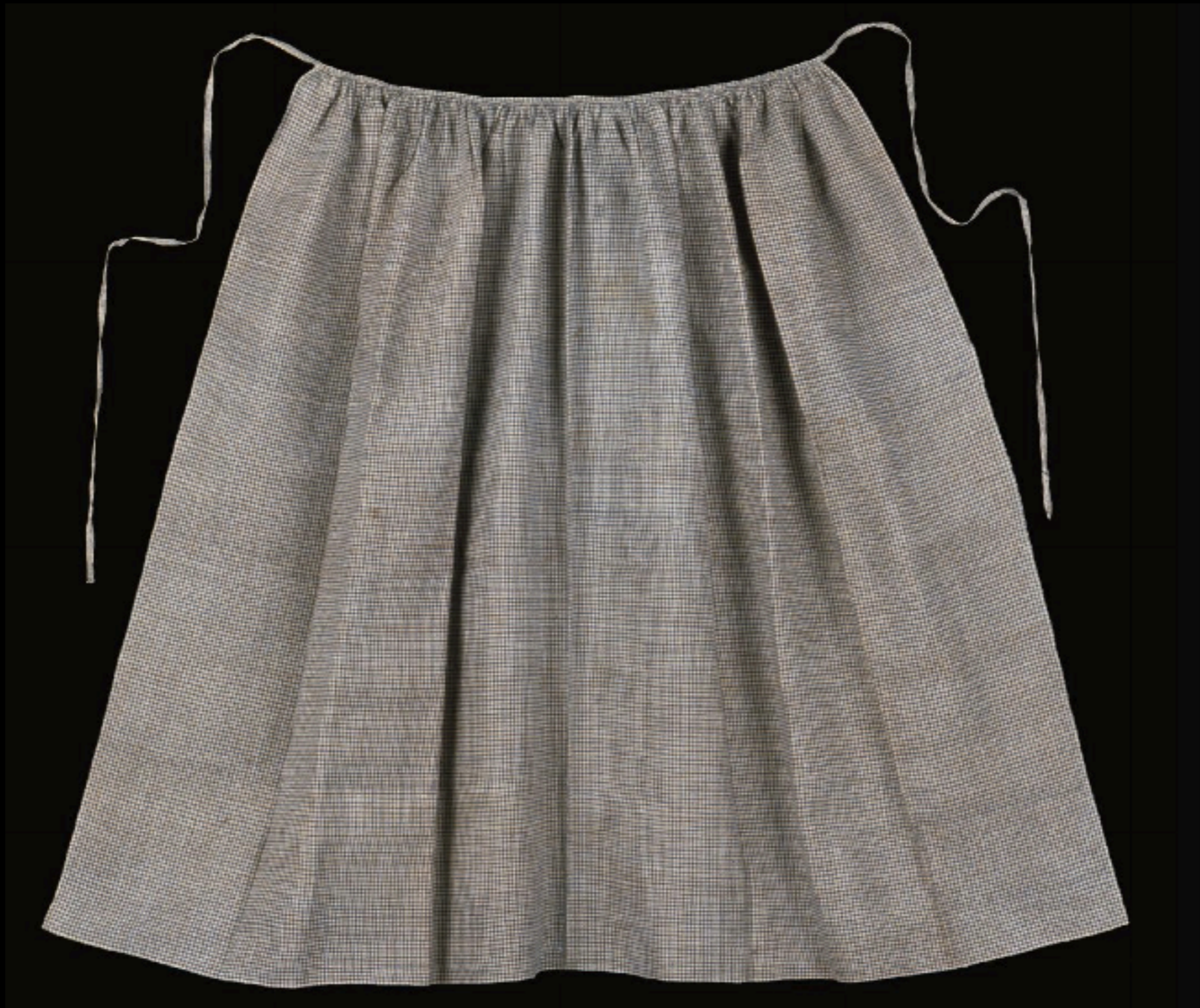
American Checked Linen Apron Marked "E F 1776" (Colonial Williamsburg)