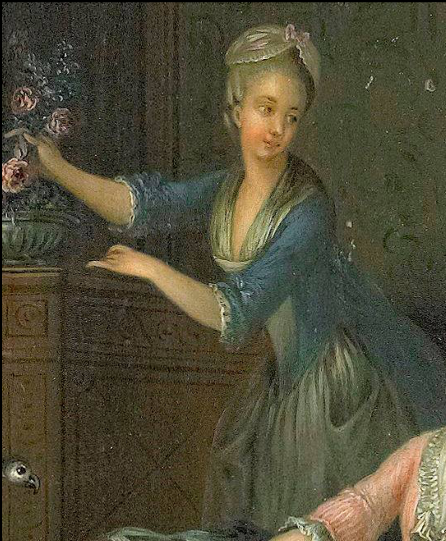
Detail: Pocket Apron From "An Elegant Interior" by Nicolas Lafrensen 1780