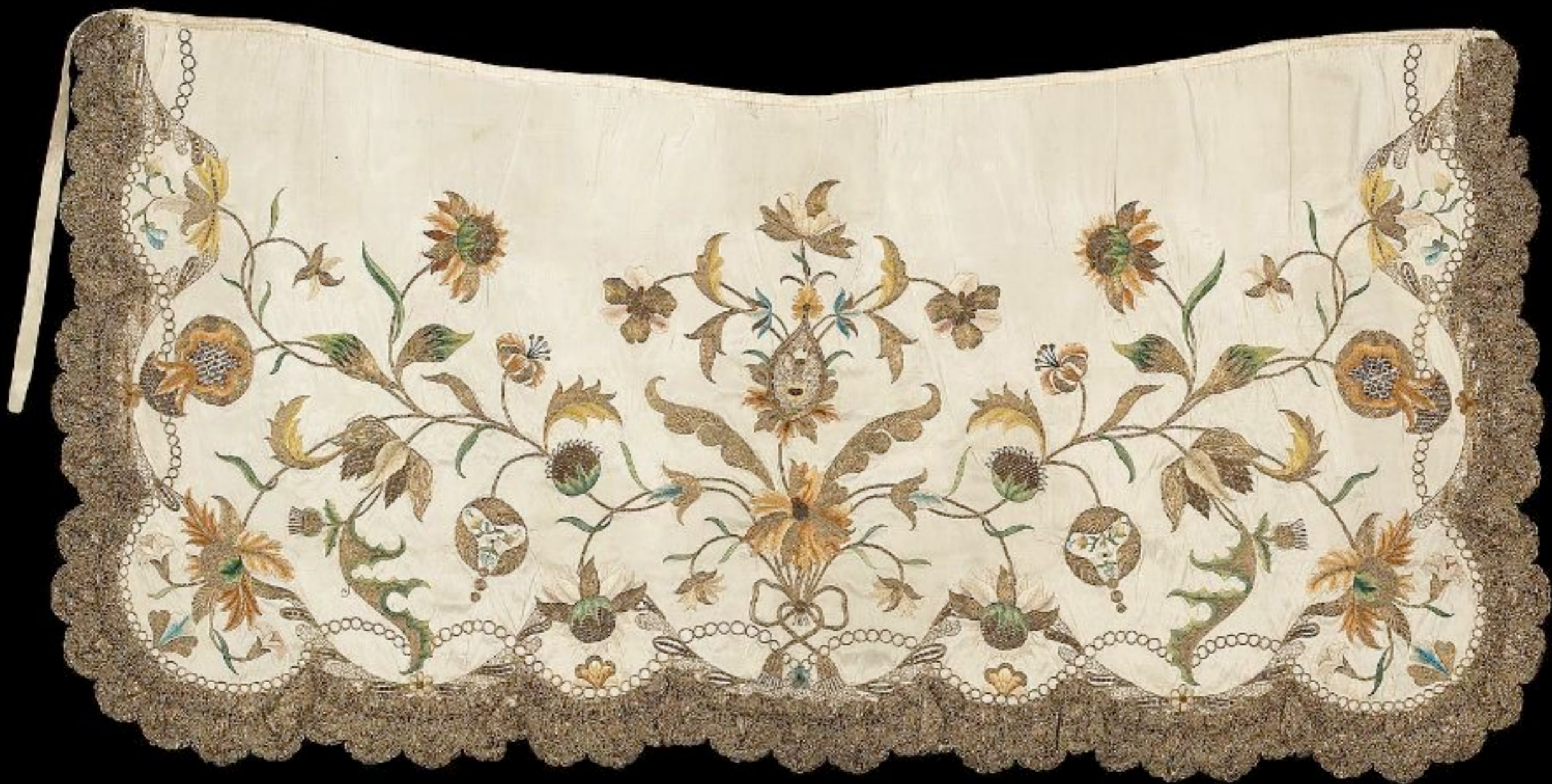
French Silk Apron 18th Century (Museum of Fine Arts, Boston)