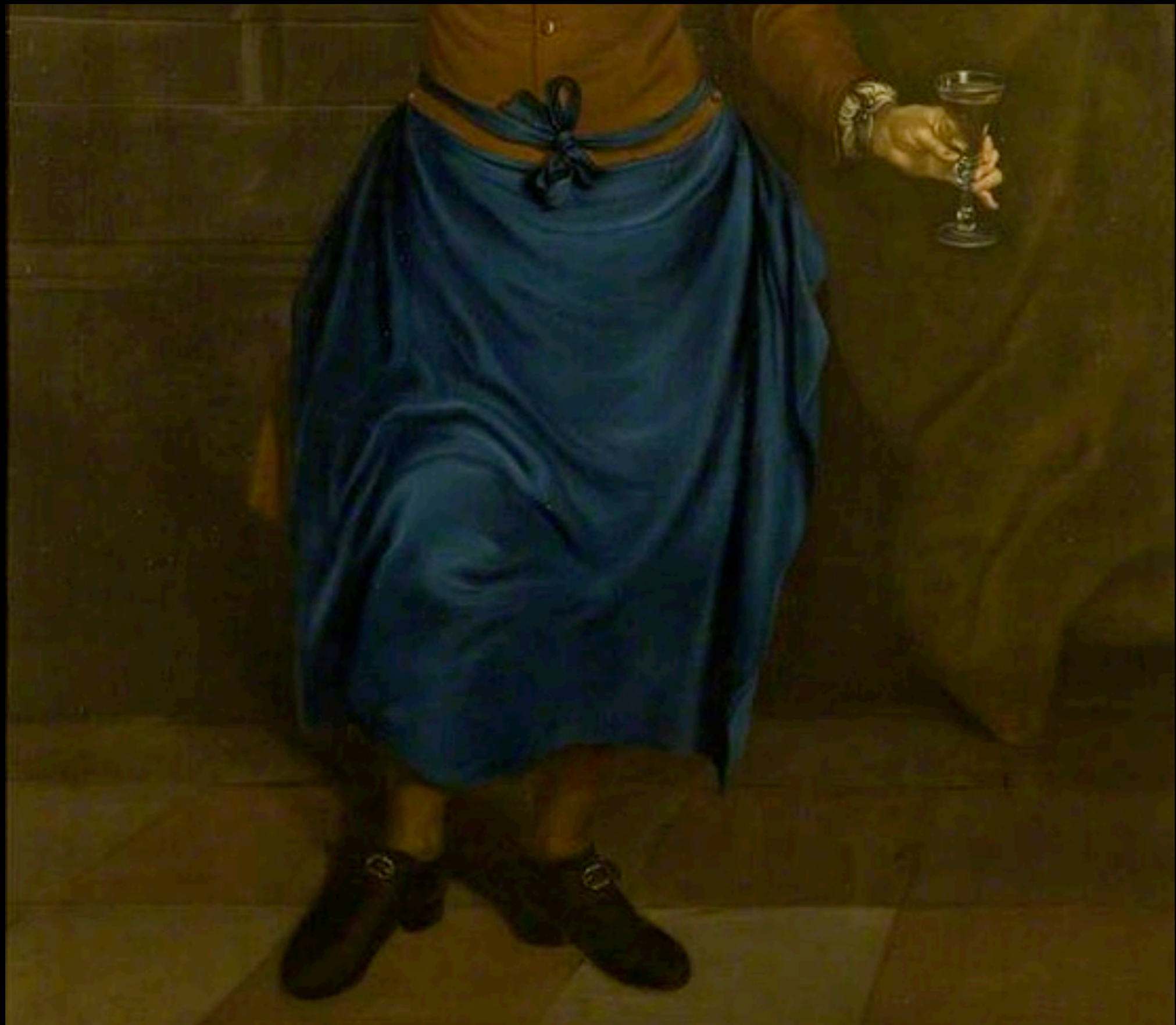
The Pot-Boy by British School c. 1720 (The British Museum)