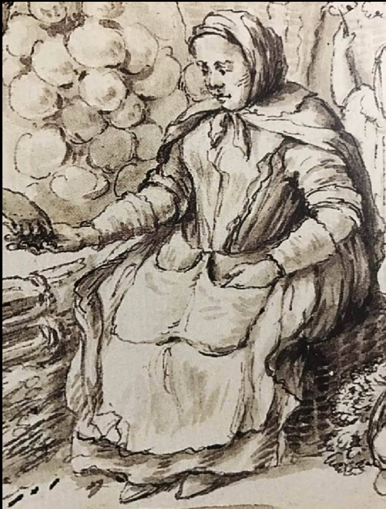
Detail: Pocket Apron on a Woman at "A Green Stall at the Root Market" From "The Cries of Dublin Drawn from the Life" by Hugh Douglas Hamilton, 1760