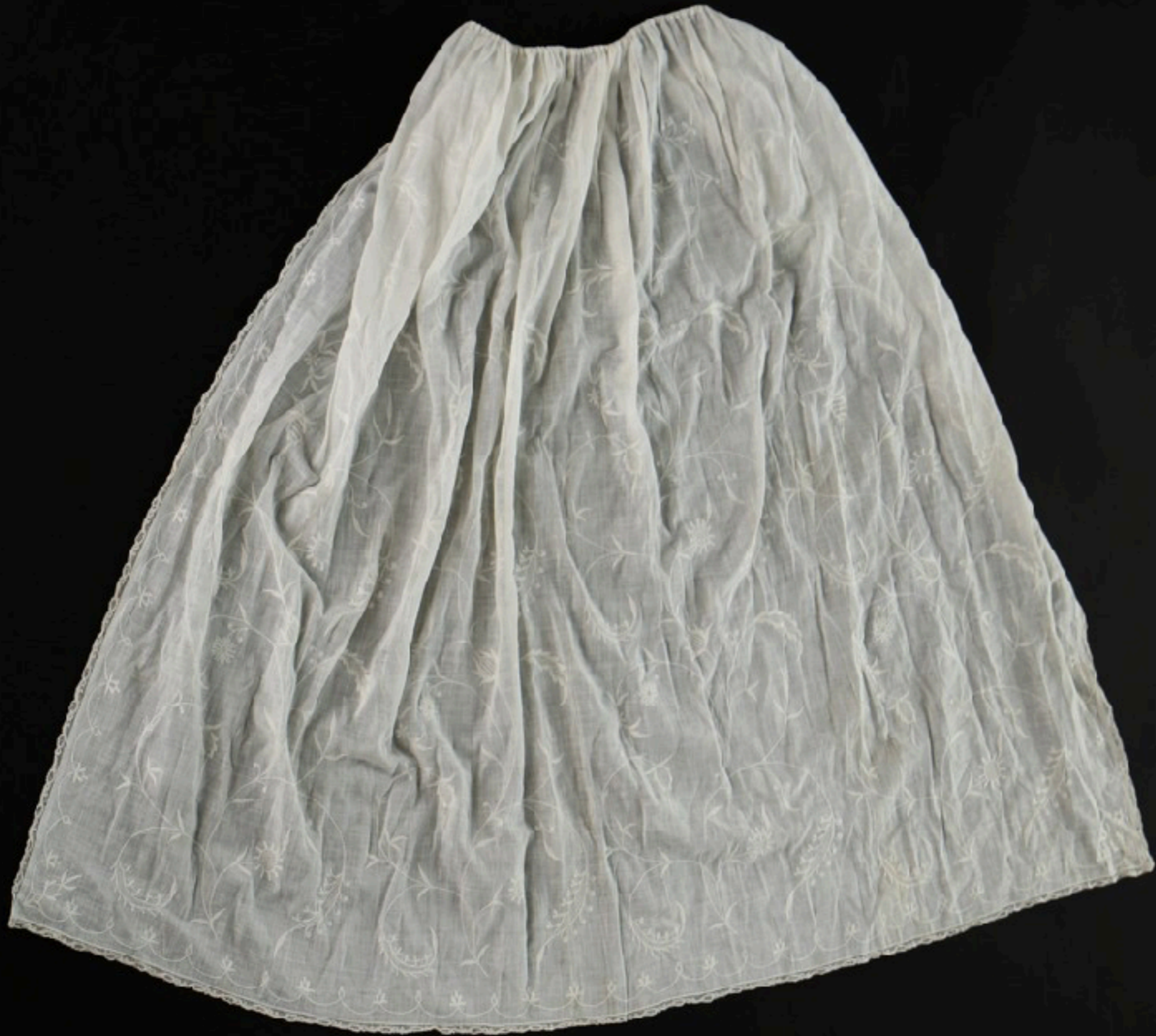
English Muslin Tambour Embroidered Apron c. 1770 - 1780