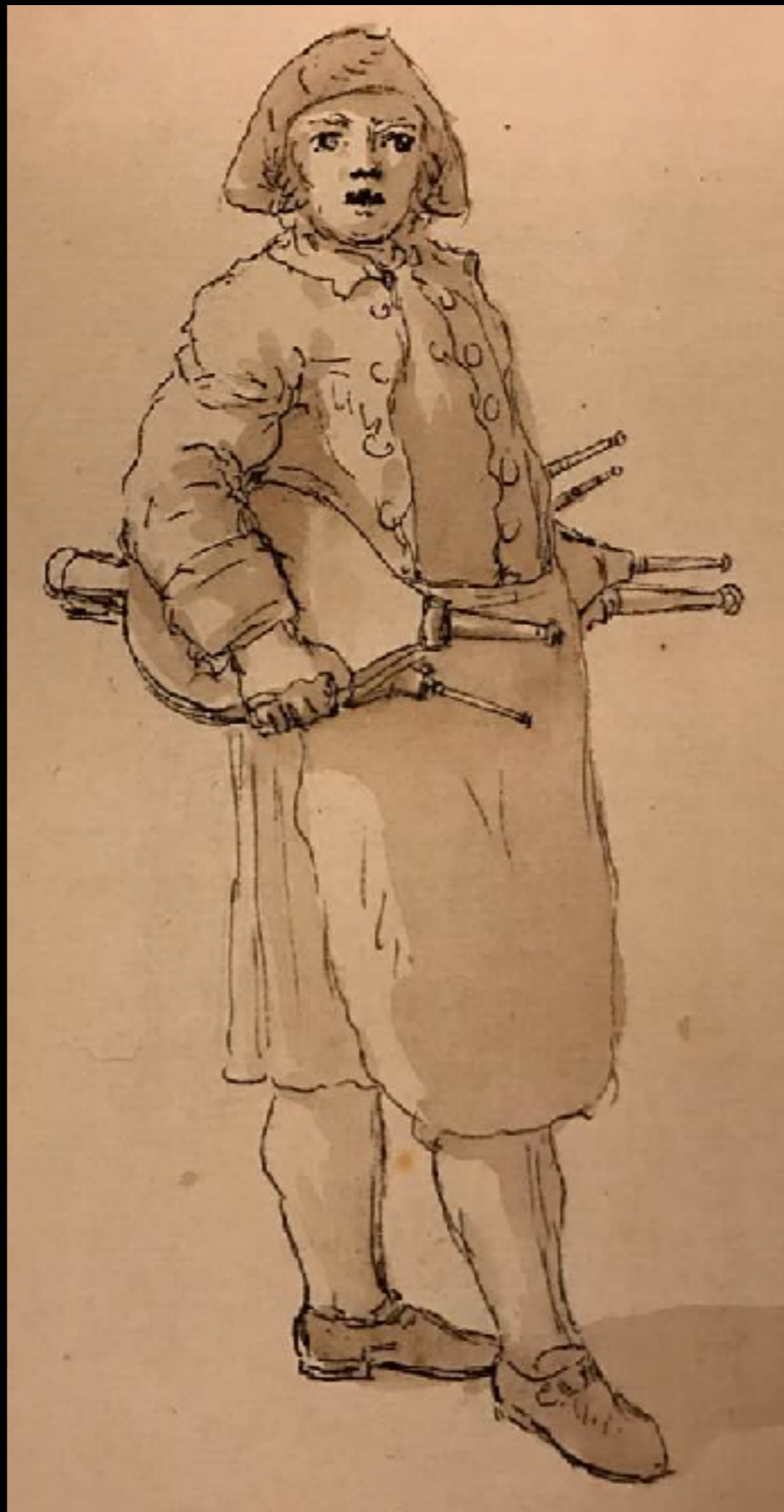
"A Bellows Mender"