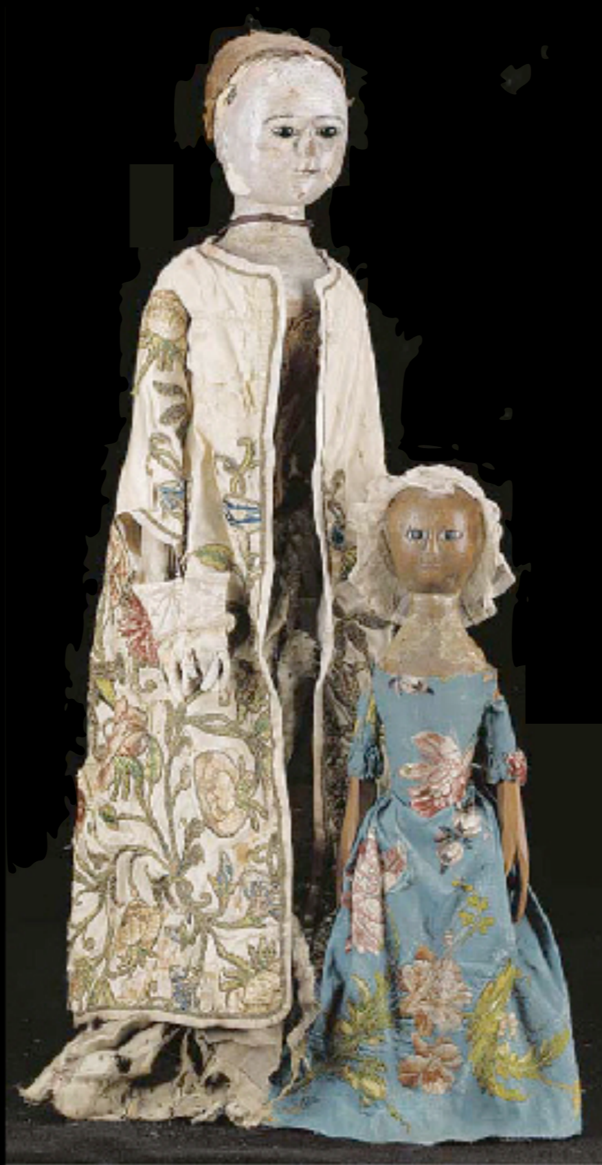
Dolls 18th Century (Christie's Auction House)