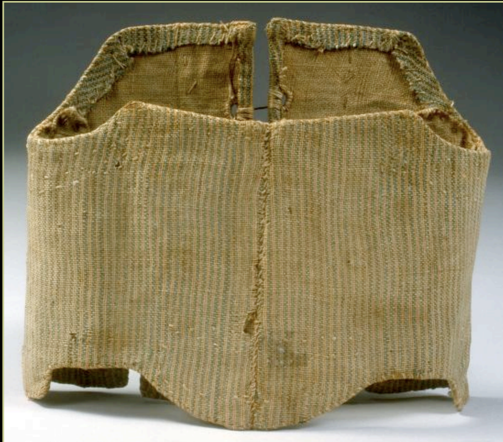
A Child's Stays Stiffened with Cardboard c. 1760 - 1790 (Memorial Hall Museum)