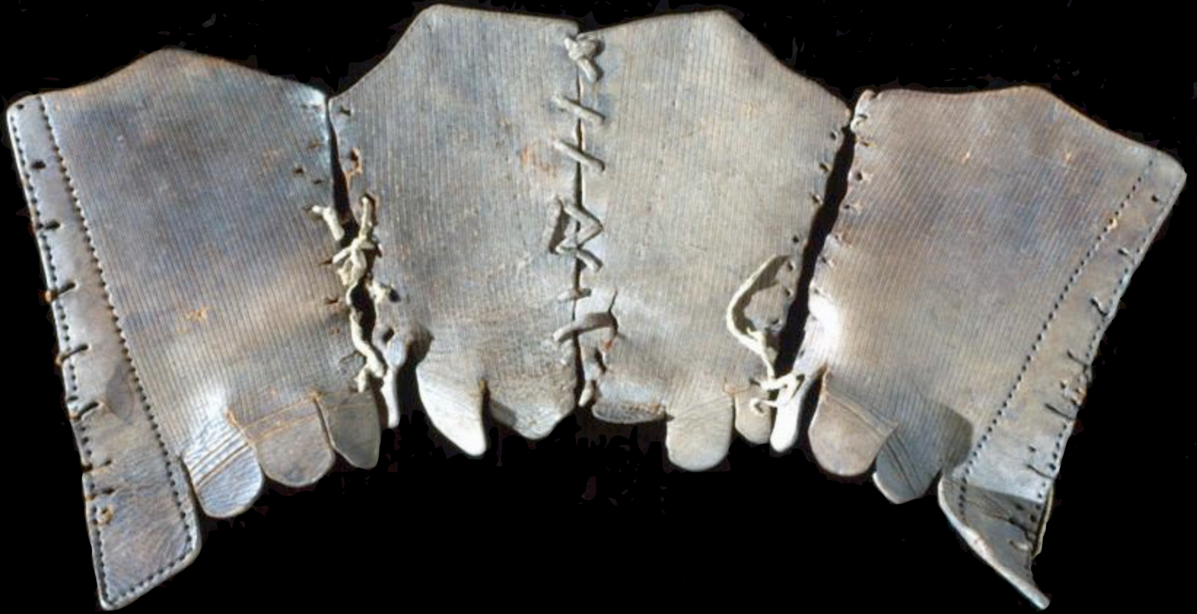
English Child's Stays of Leather c. 1760 - 1790