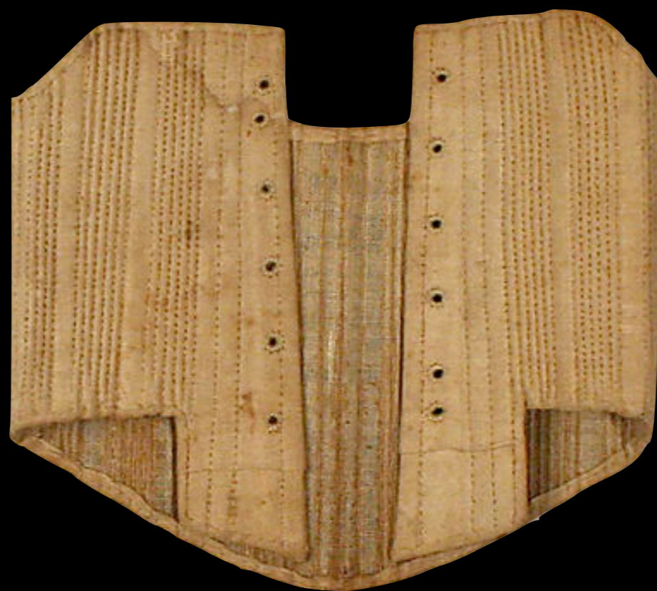
American Child's Stays of Linen & Baleen c. 1700 - 1799 (Metropolitan Museum of Art)