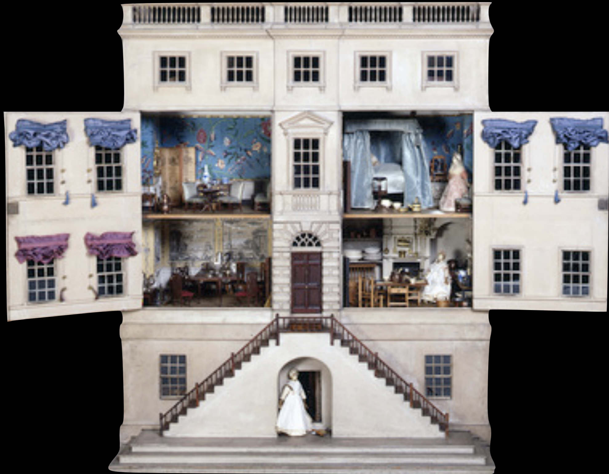
Doll's House or the Blackett Baby House c. 1740 - 1742 (Museum of London)