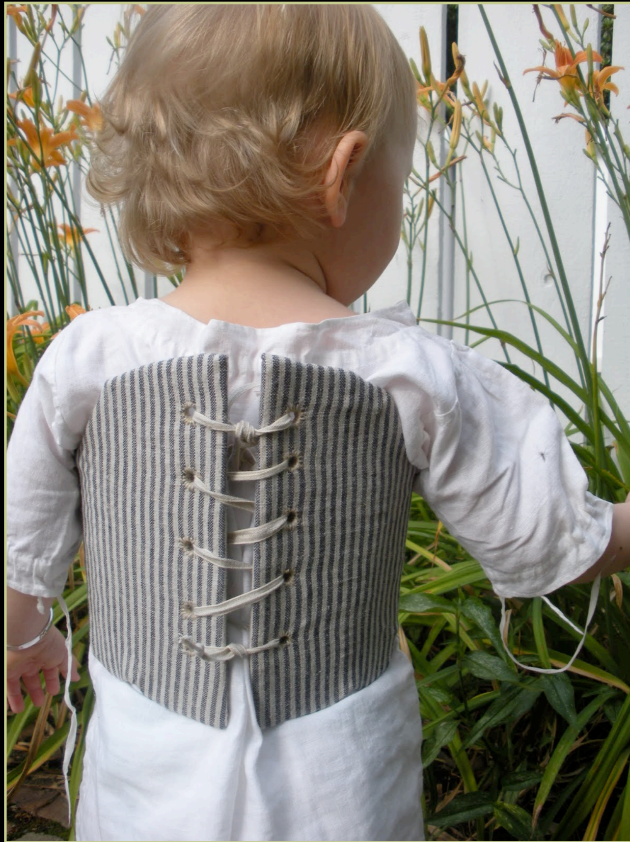
Recreated Child's Stays