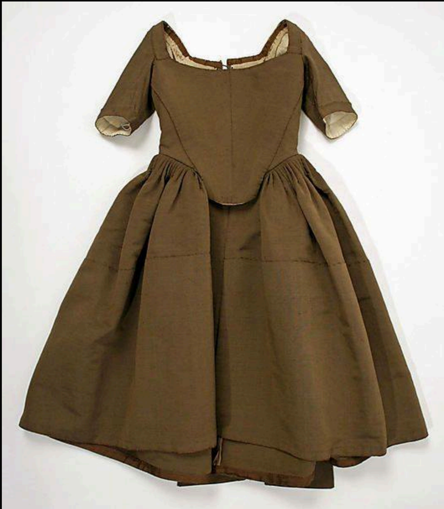
Wool & Silk Dress c. 1740s (Metropolitan Museum of Art)