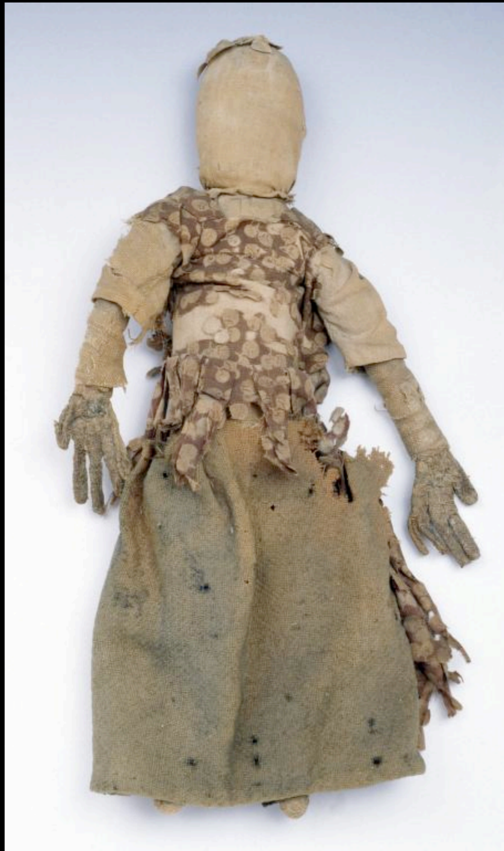
Doll c. 1770 (Deerfield Memorial Hall)