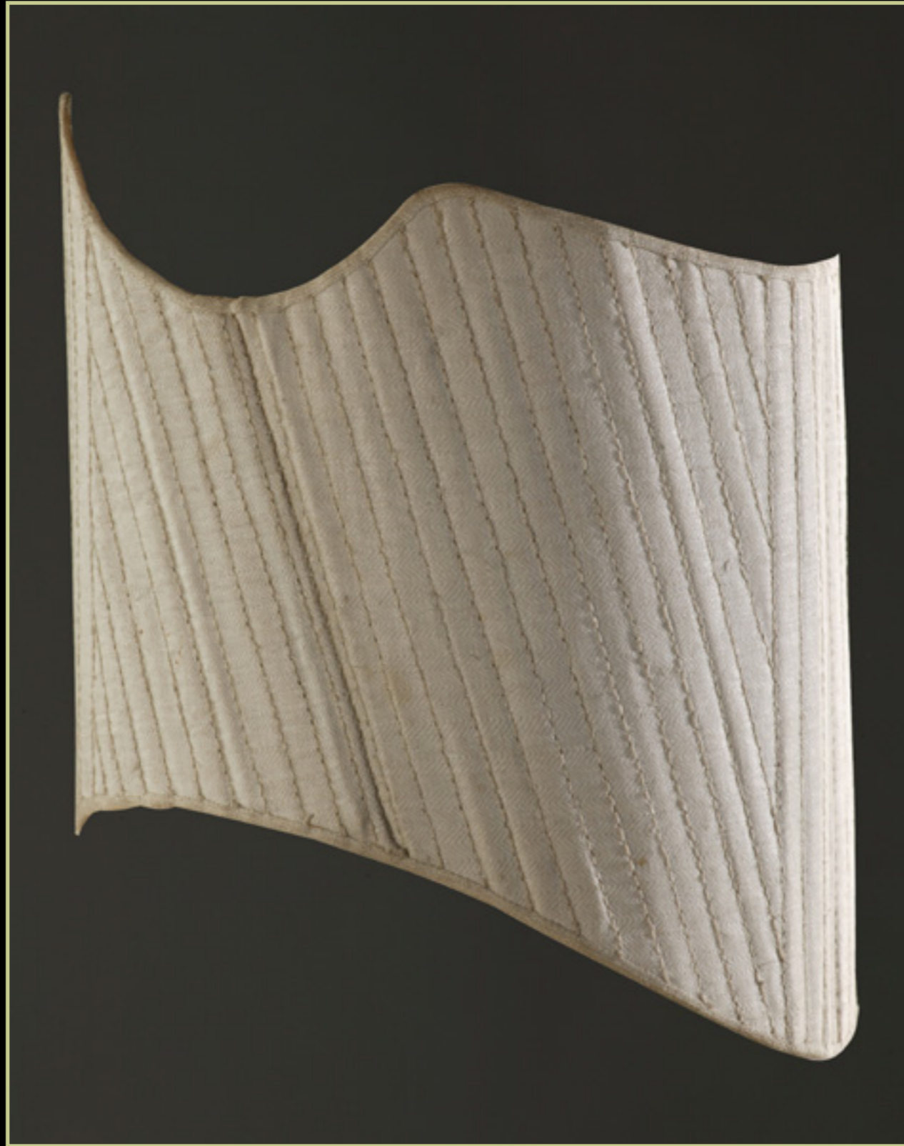
Child's Stays of Linen & Whalebone