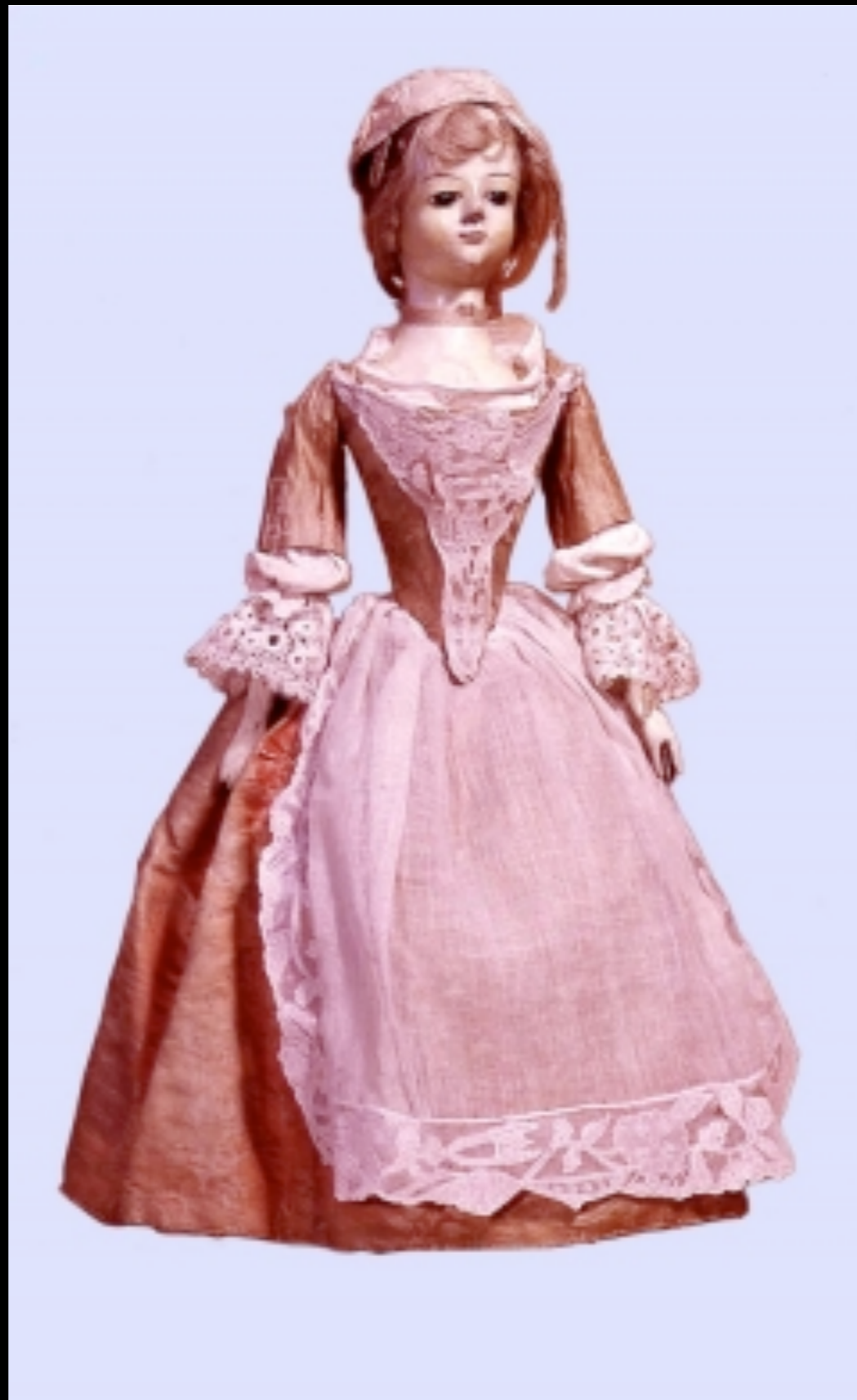
Doll c. 1735 (Bowes Museum)