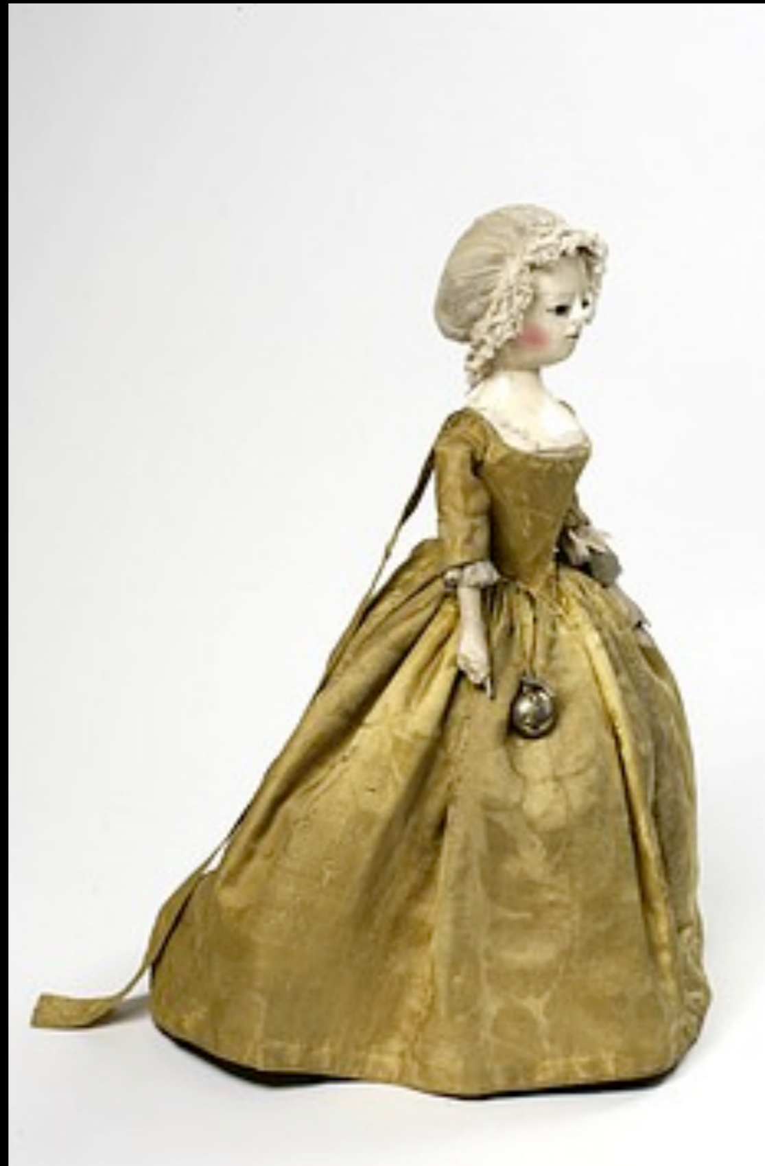
Doll c. 1740 (Victoria & Albert Museum)