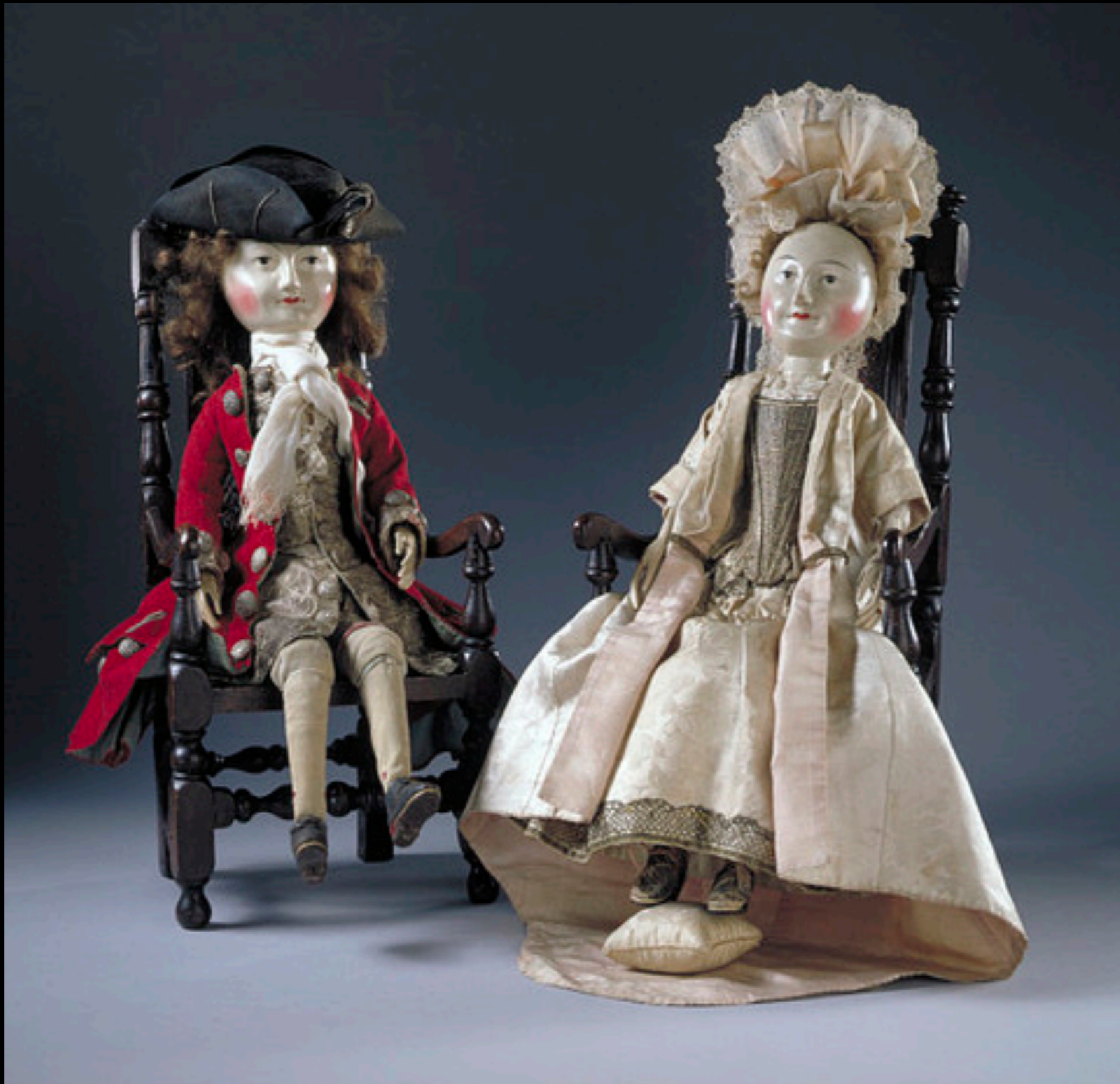
Dolls c. 1700 - 1710 (Victoria & Albert Museum)