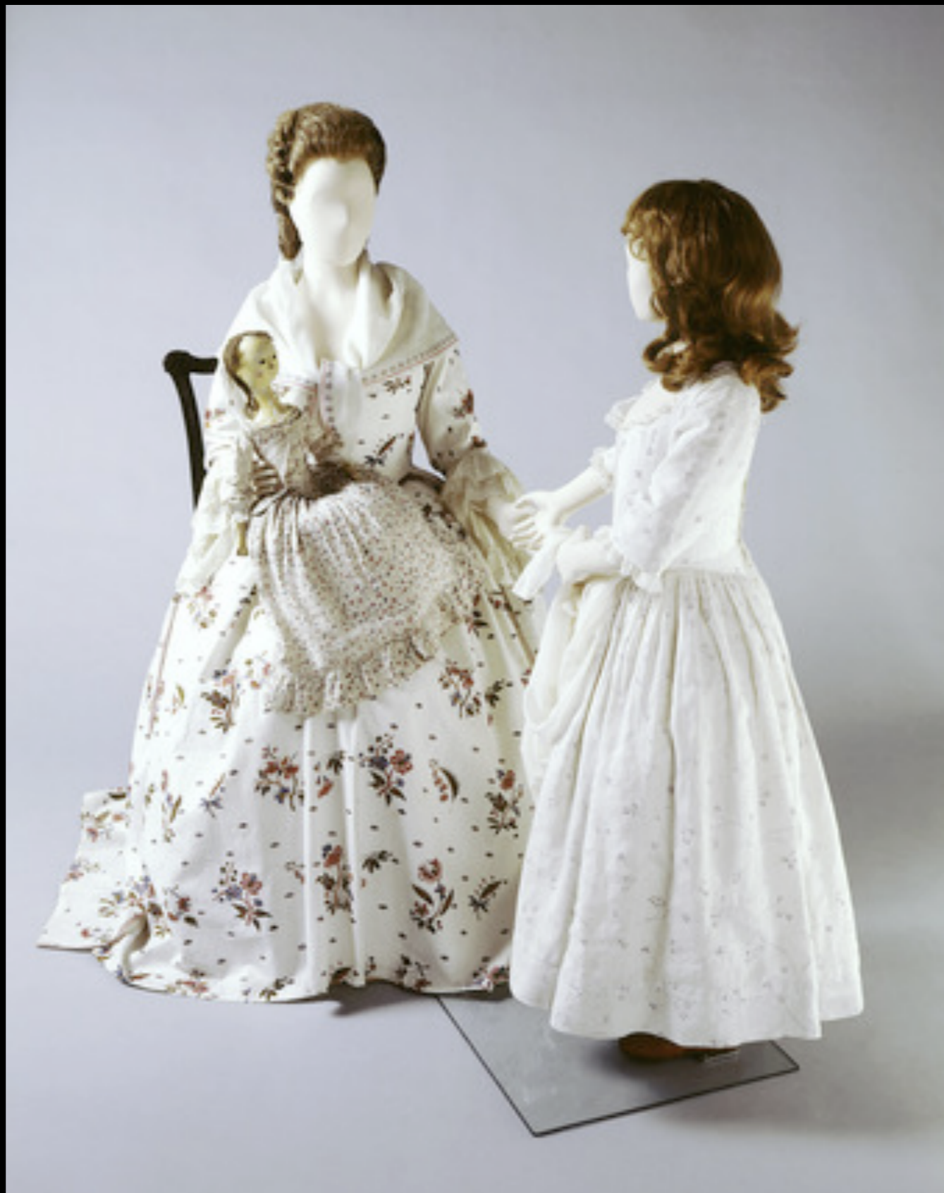
Linen Dresses c. 1700 - 1779 and Doll c. 1750 (Museum of London)