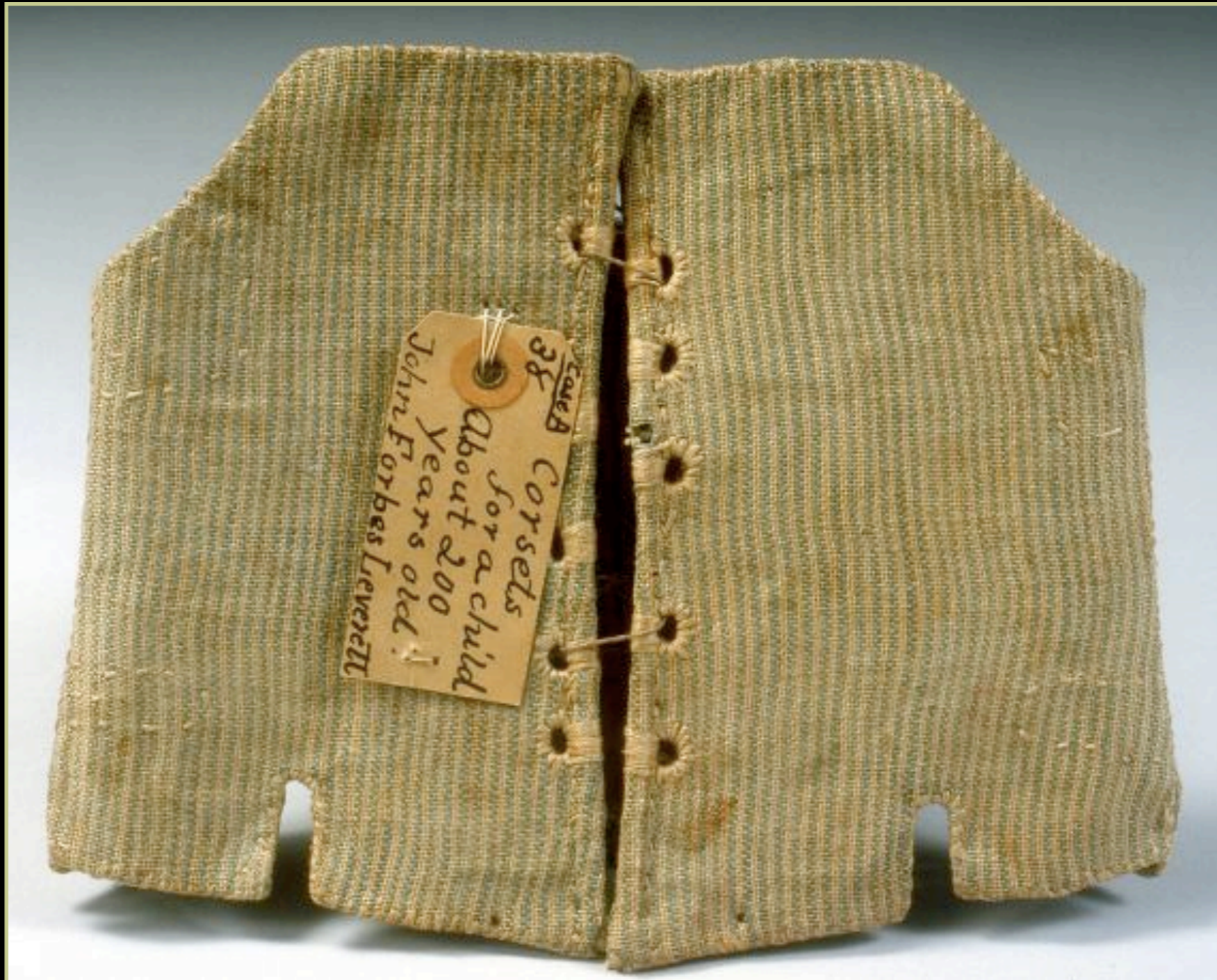
A Child's Stays Stiffened with Cardboard c. 1760 - 1790 (Memorial Hall Museum)