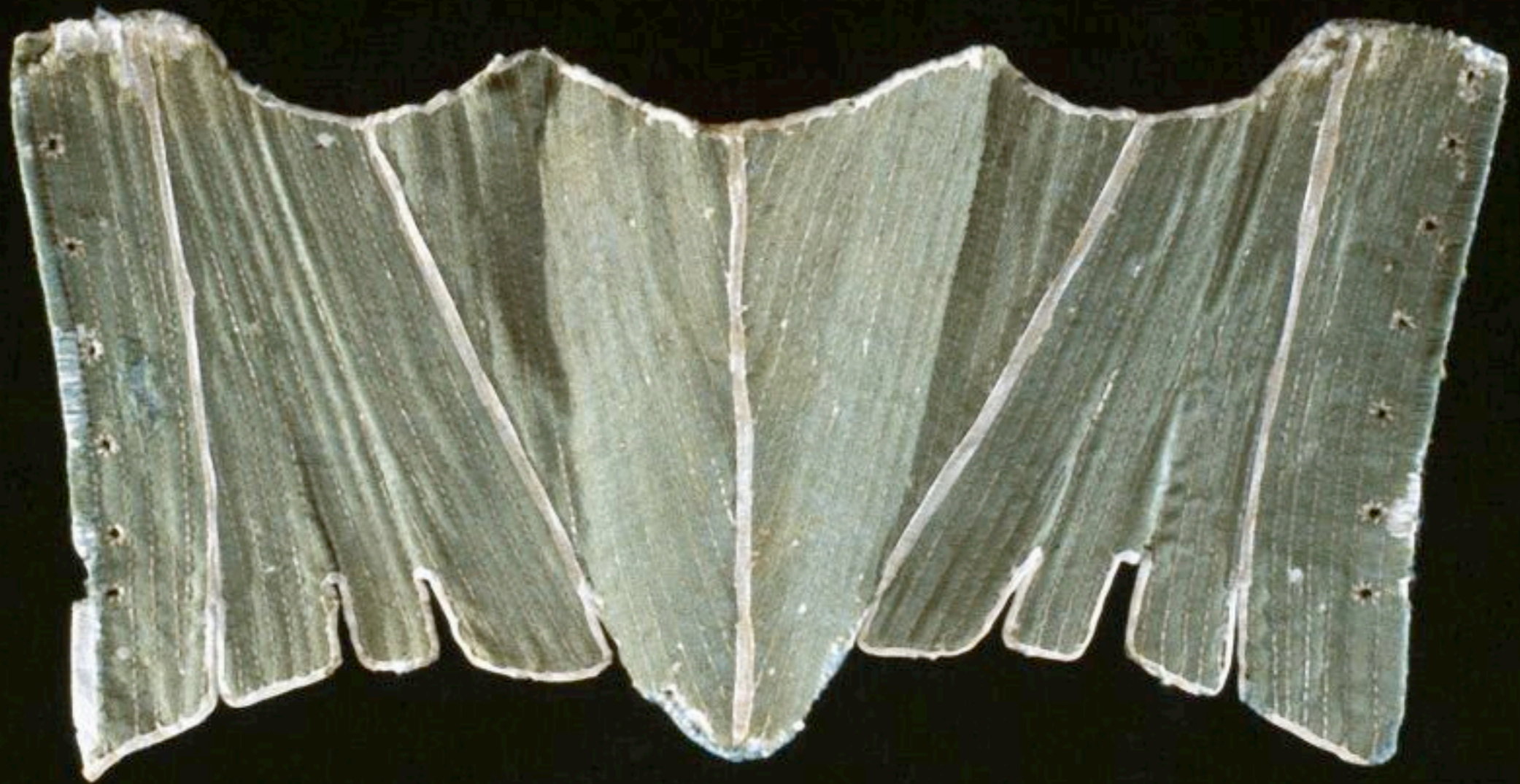
English or American Child's Stays of Green Wool c. 1740 - 1760 (Colonial Williamsburg)