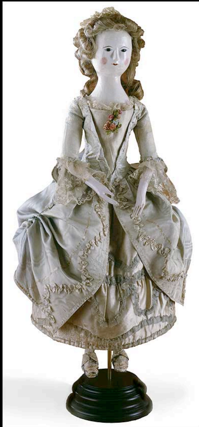
Doll 18th Century