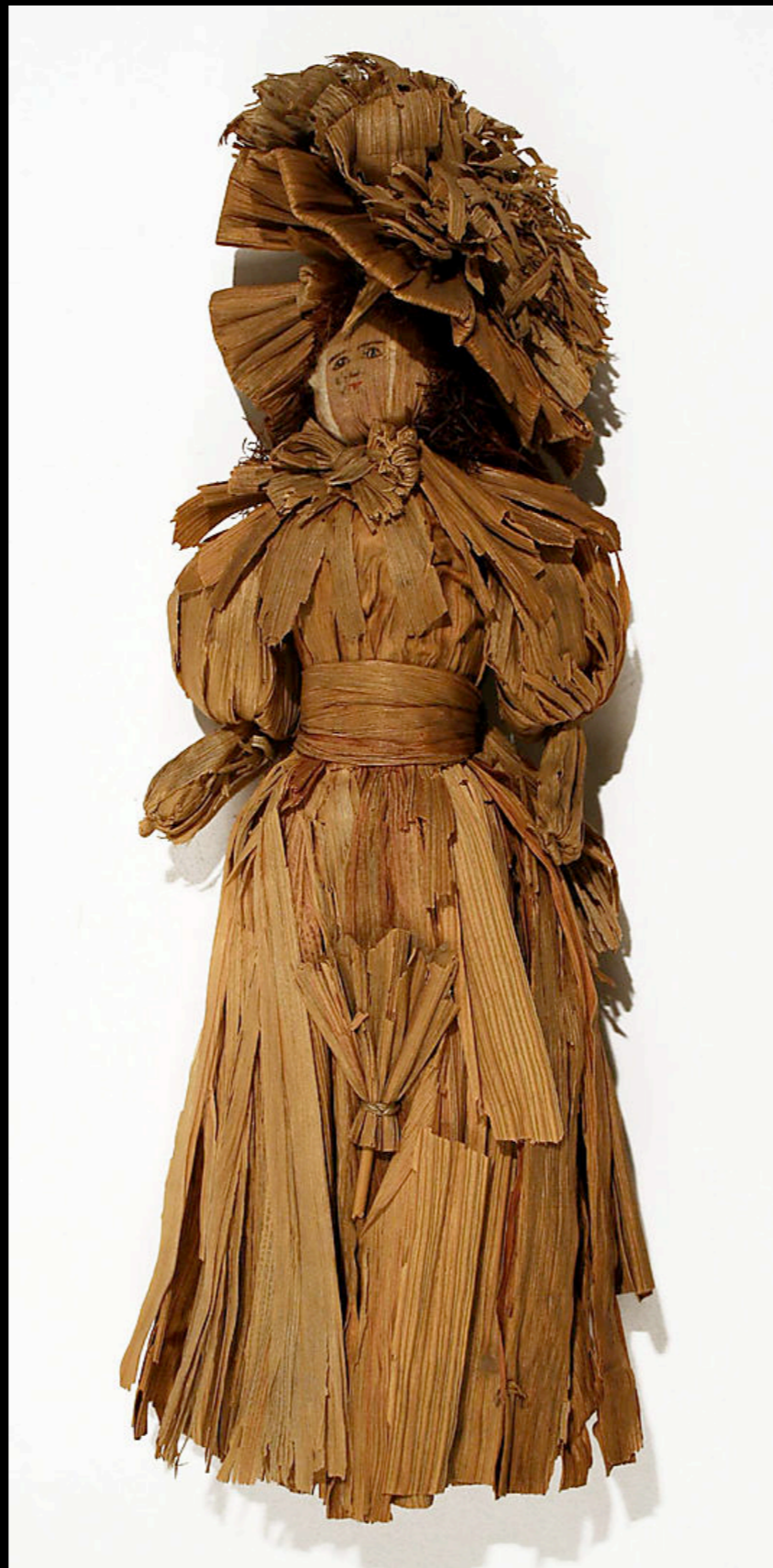
Doll Late 18th Century (Metropolitan Museum of Art)