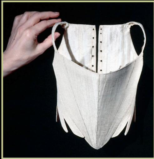
English Silk Child's Stays c 1775 (Colonial Williamsburg)