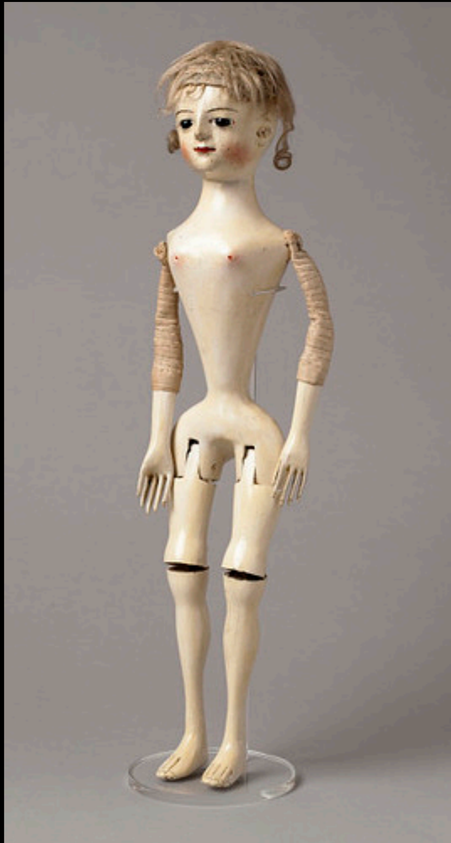
English Wood Carved Doll c. 1700 - 1720 (Victoria & Albert Museum)