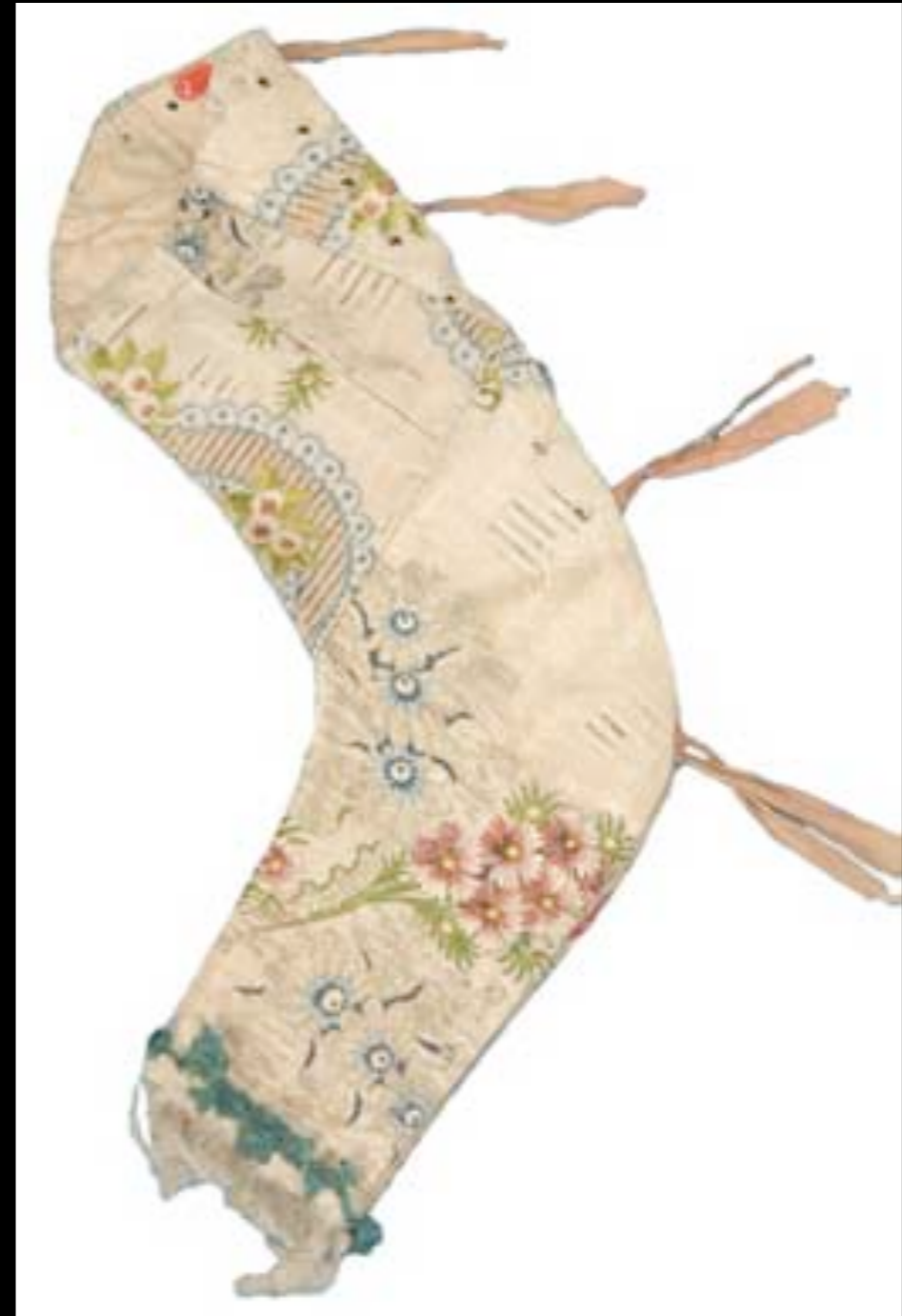
Pieced Silk Brocade Child's Stays with Detachable Sleeves c. 1750