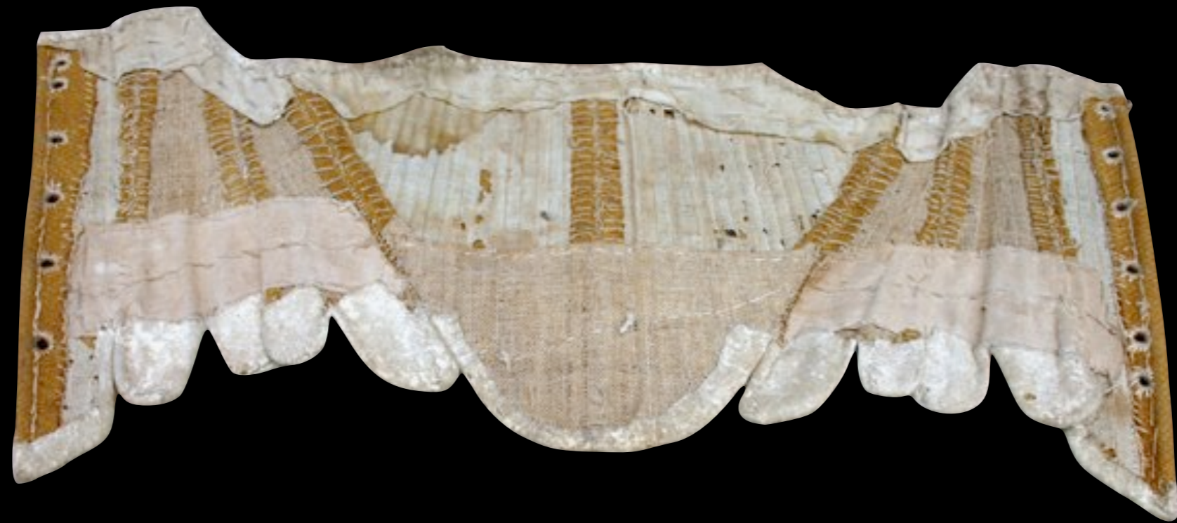
Child's Stays of Linen & Leather c. 1770 (Philadelphia Museum of Art)