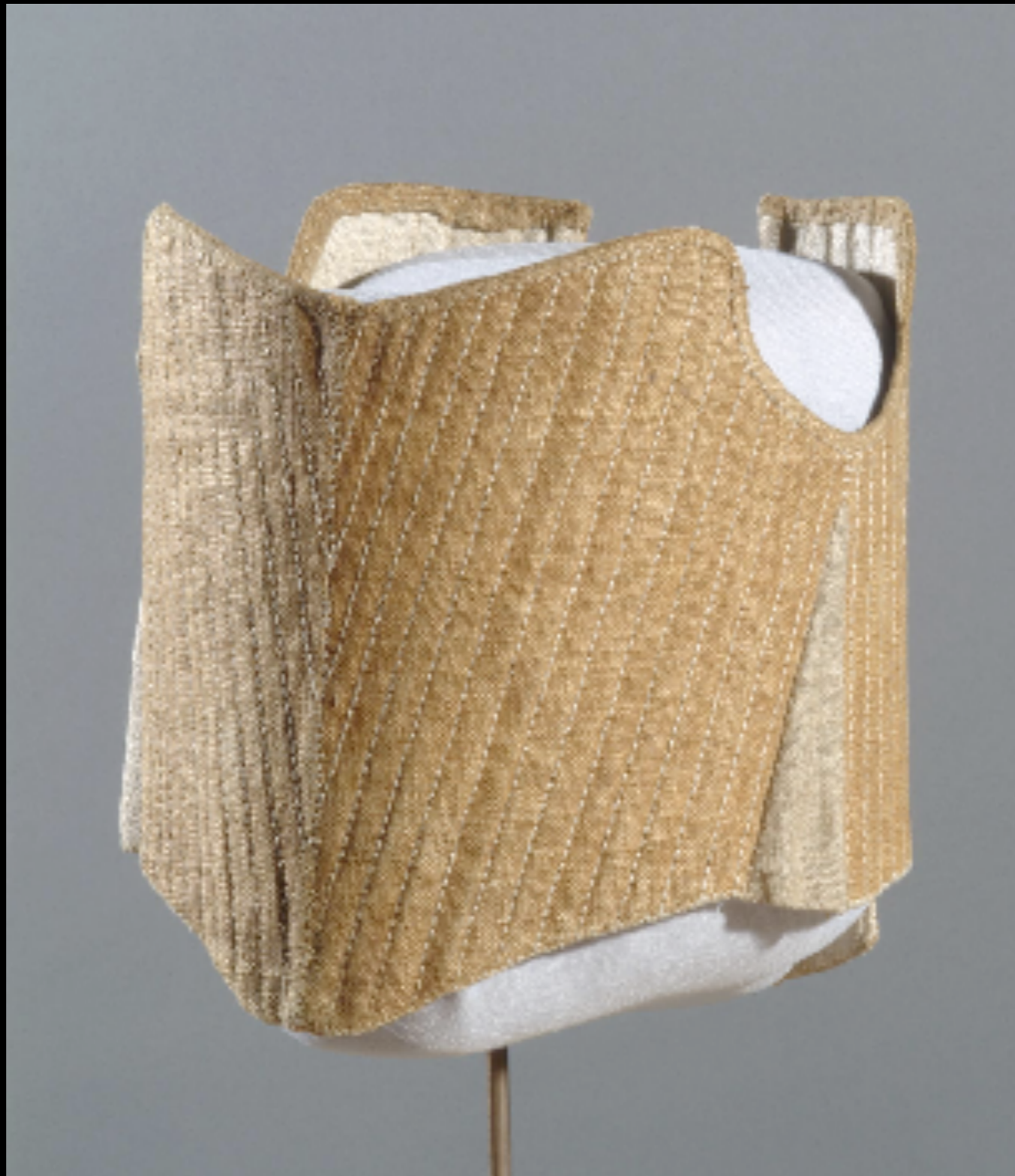
American Child's Stays (For a Child 18 - 24 Months of Age) c. 1770 - 1790 (Philadelphia Museum of Art)