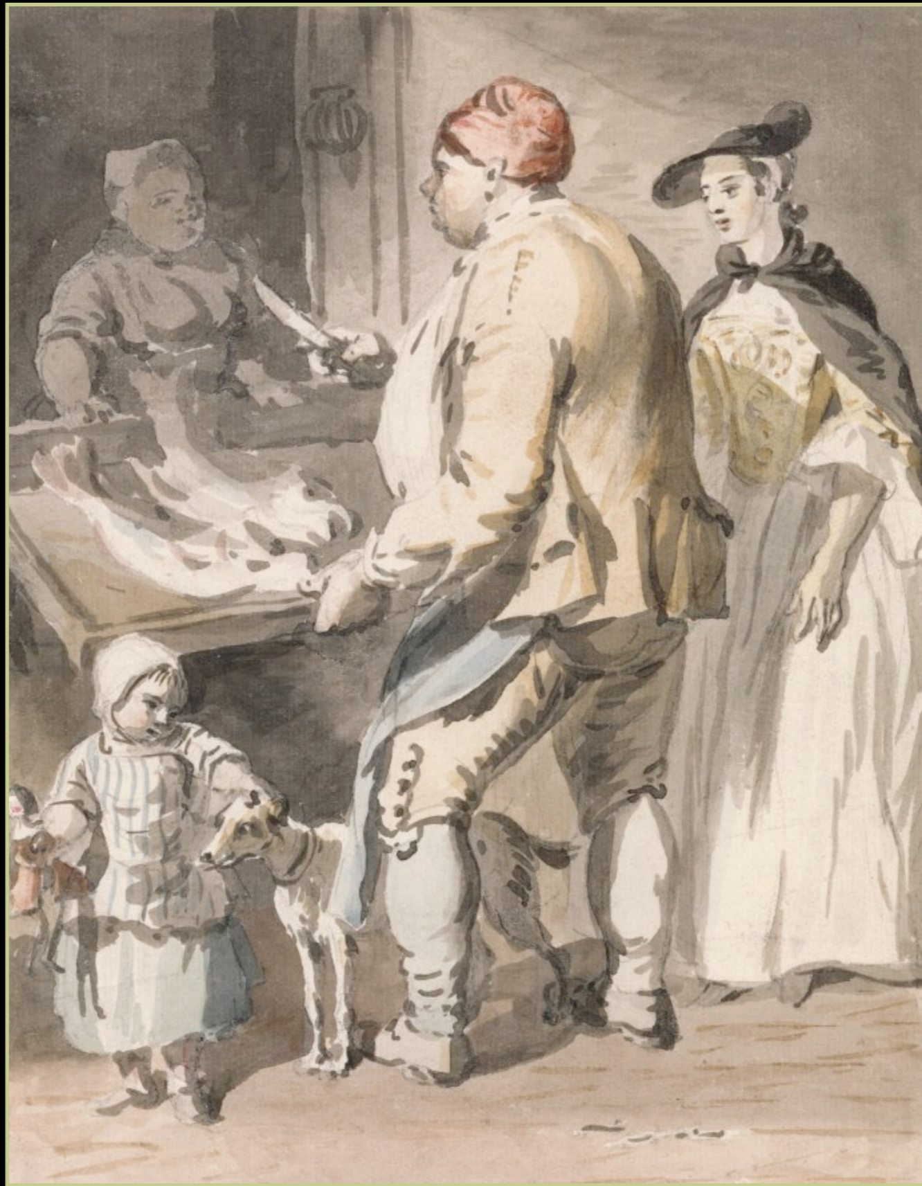
Young Child in Stays "The Fishmonger" by Paul Sandby (English) c. 1759 (Yale Museum of British Art)