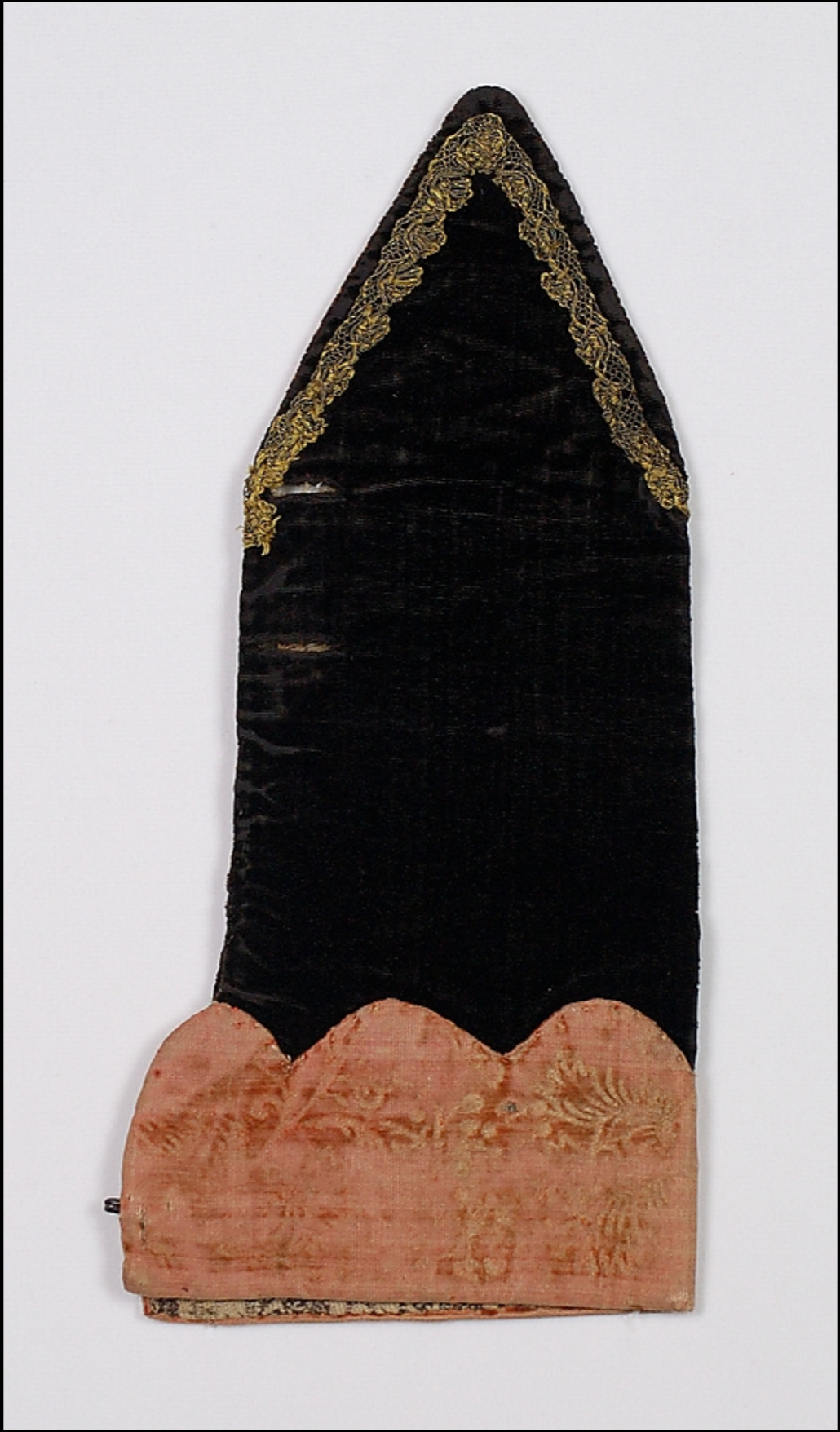
English Silk, Cotton & Metallic Mitts c. 1680 - 1720 (Metropolitan Museum of Art)