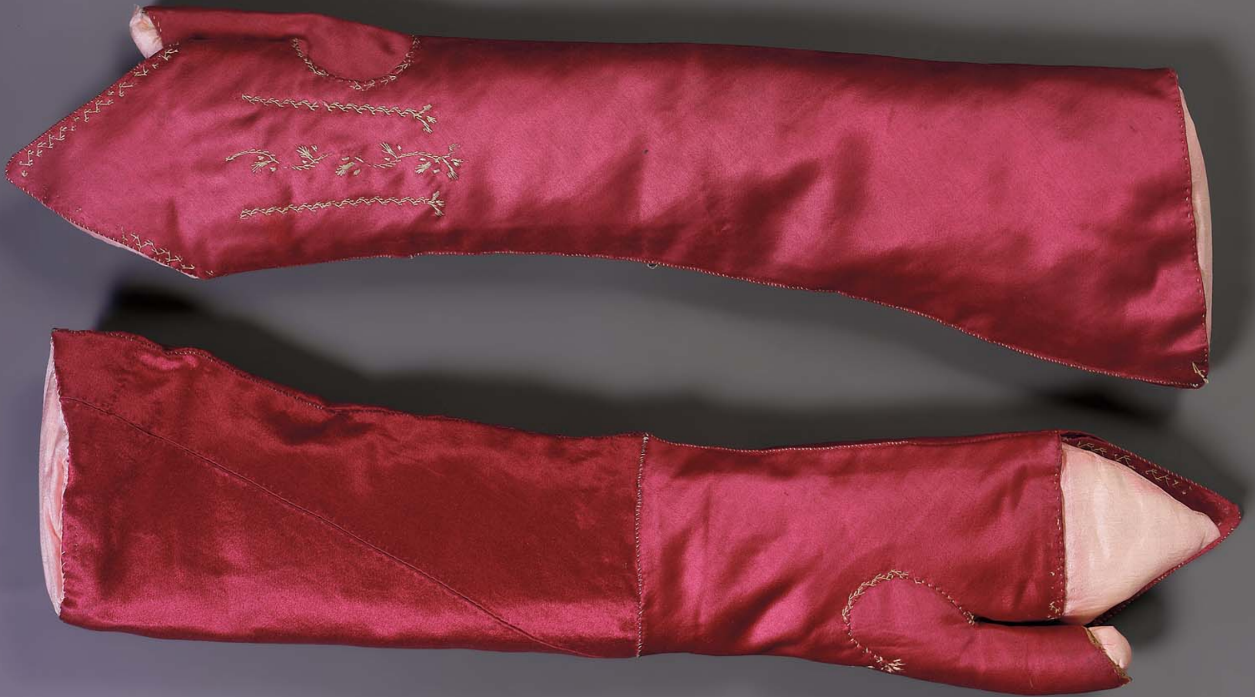
Silk Satin Mitts 18th Century (Museum of Fine Arts, Boston)