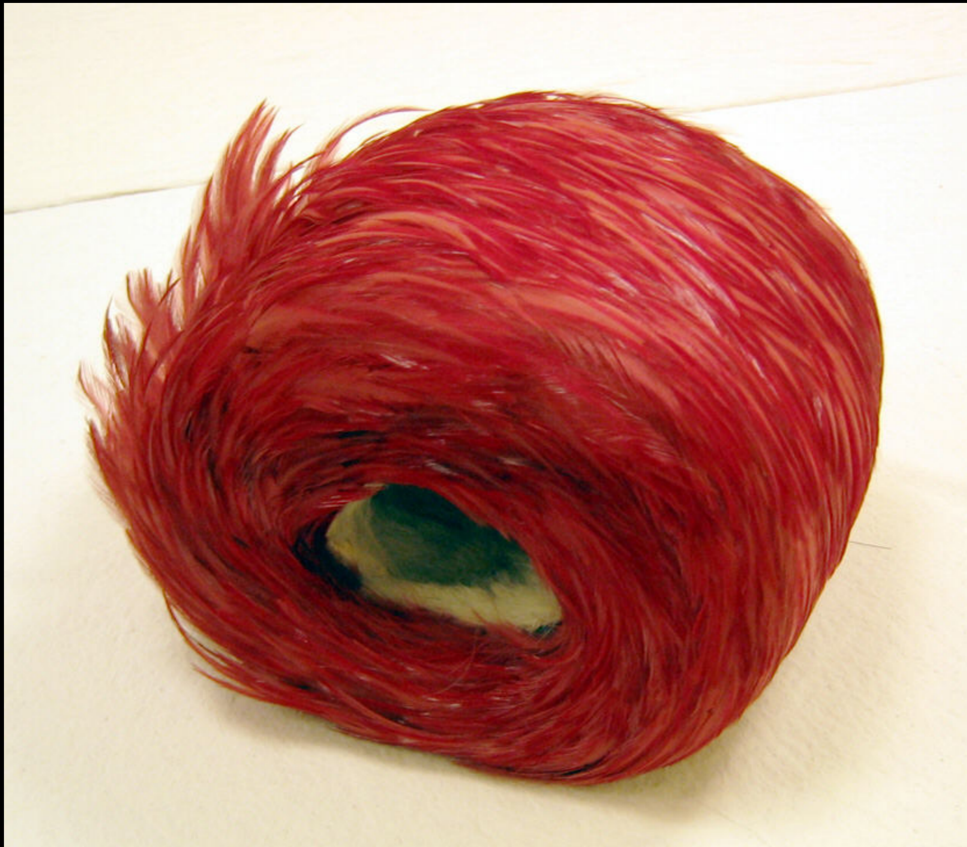
English Feather & Fur Muff c. 1750 - 1775 (Metropolitan Museum of Art)