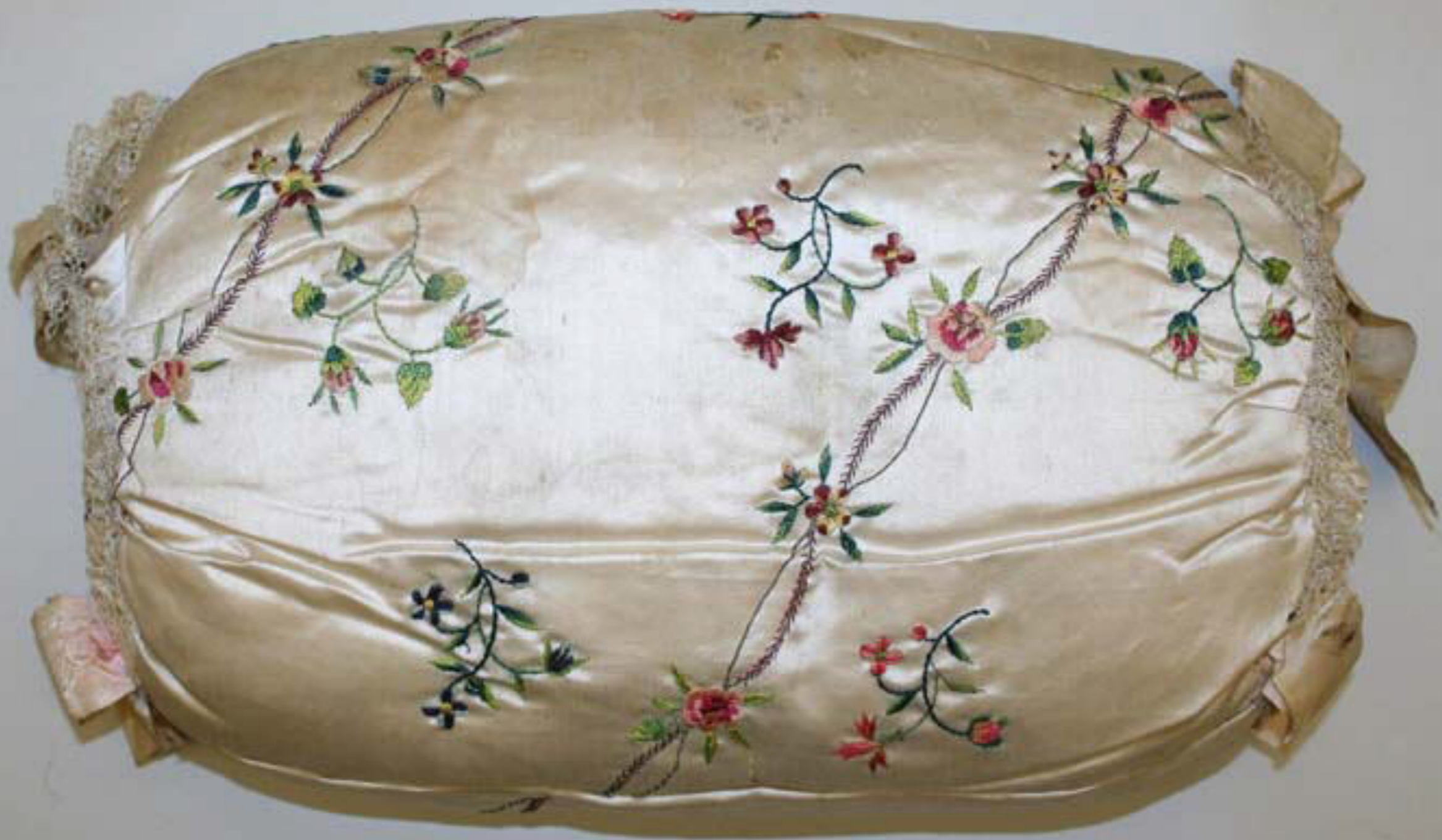
English Embroidered Silk Muff c. 1780 (Metropolitan Museum of Art)