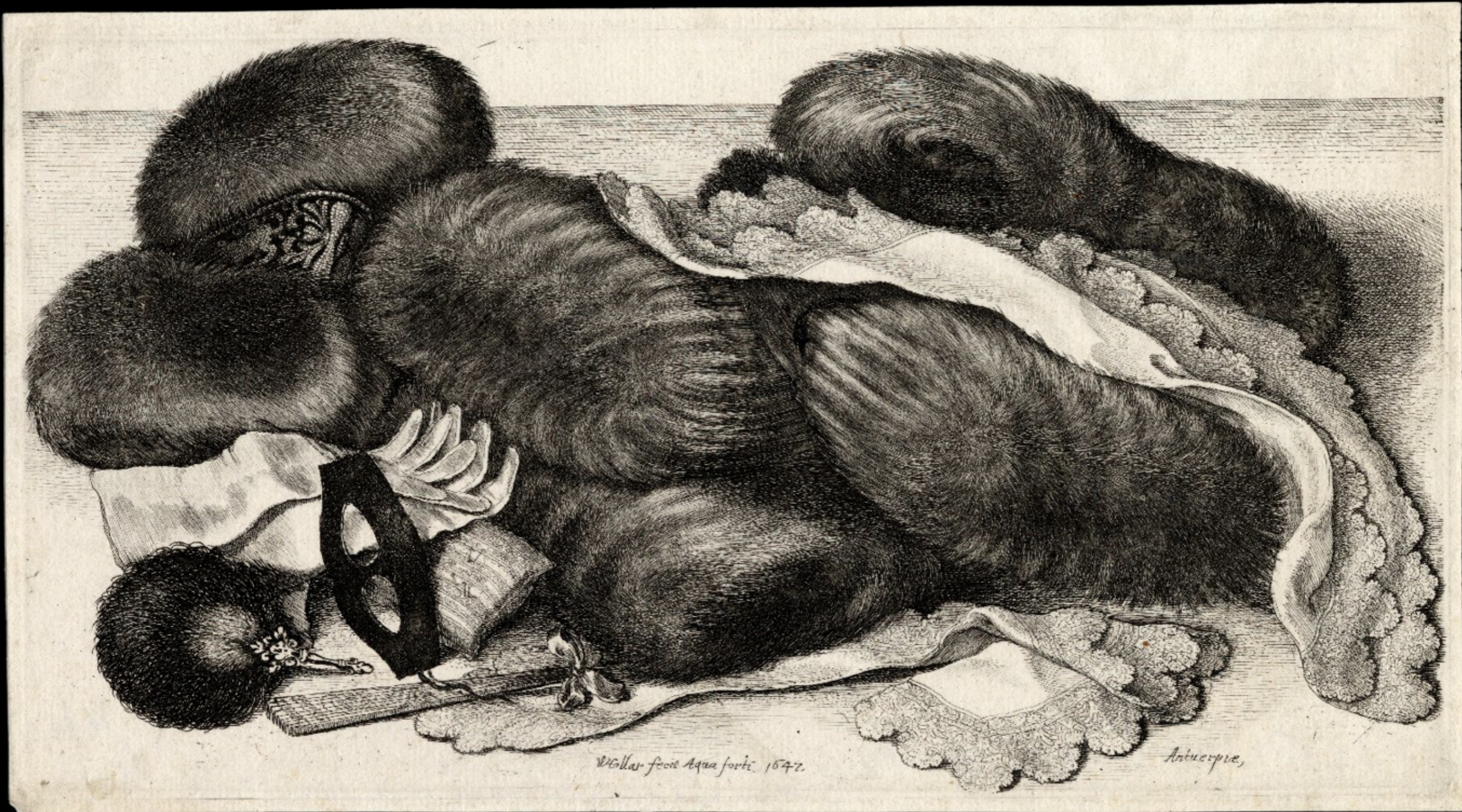
A Group of Fur Muffs and Articles of Dress on a Table 1647 (Folger Shakespeare Library)