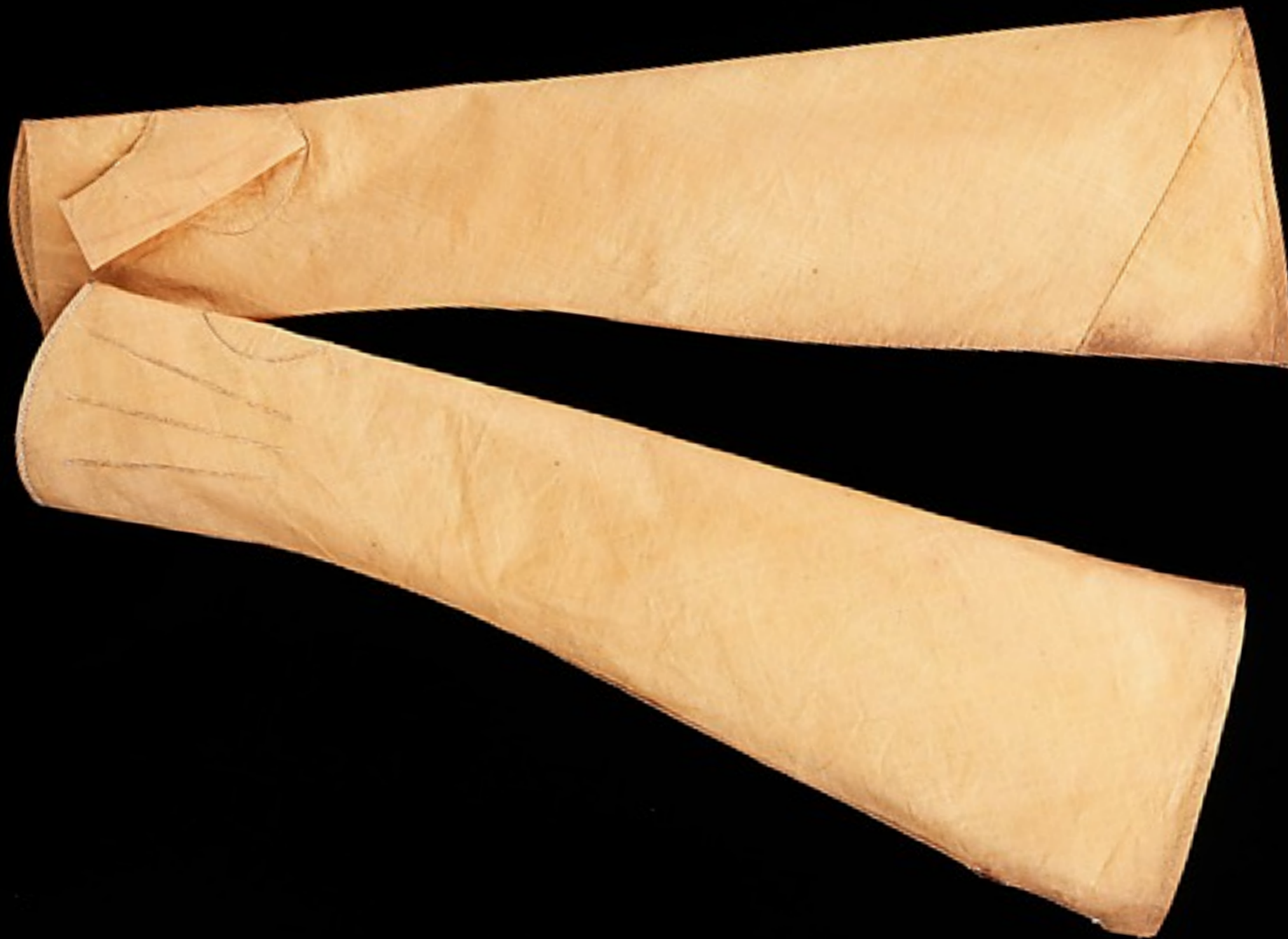
English Cotton Mitts c. 1770 (Metropolitan Museum of Art)