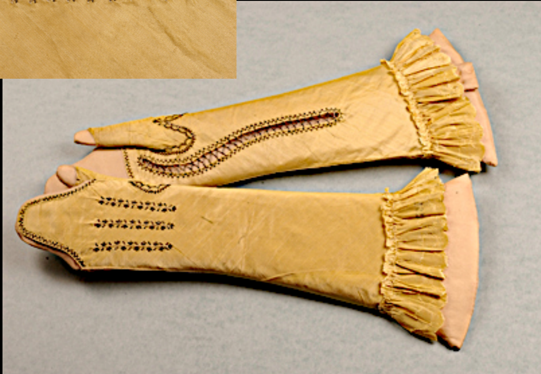
Yellow Taffeta Silk Mittens Cut on the Bias to Give Stretch