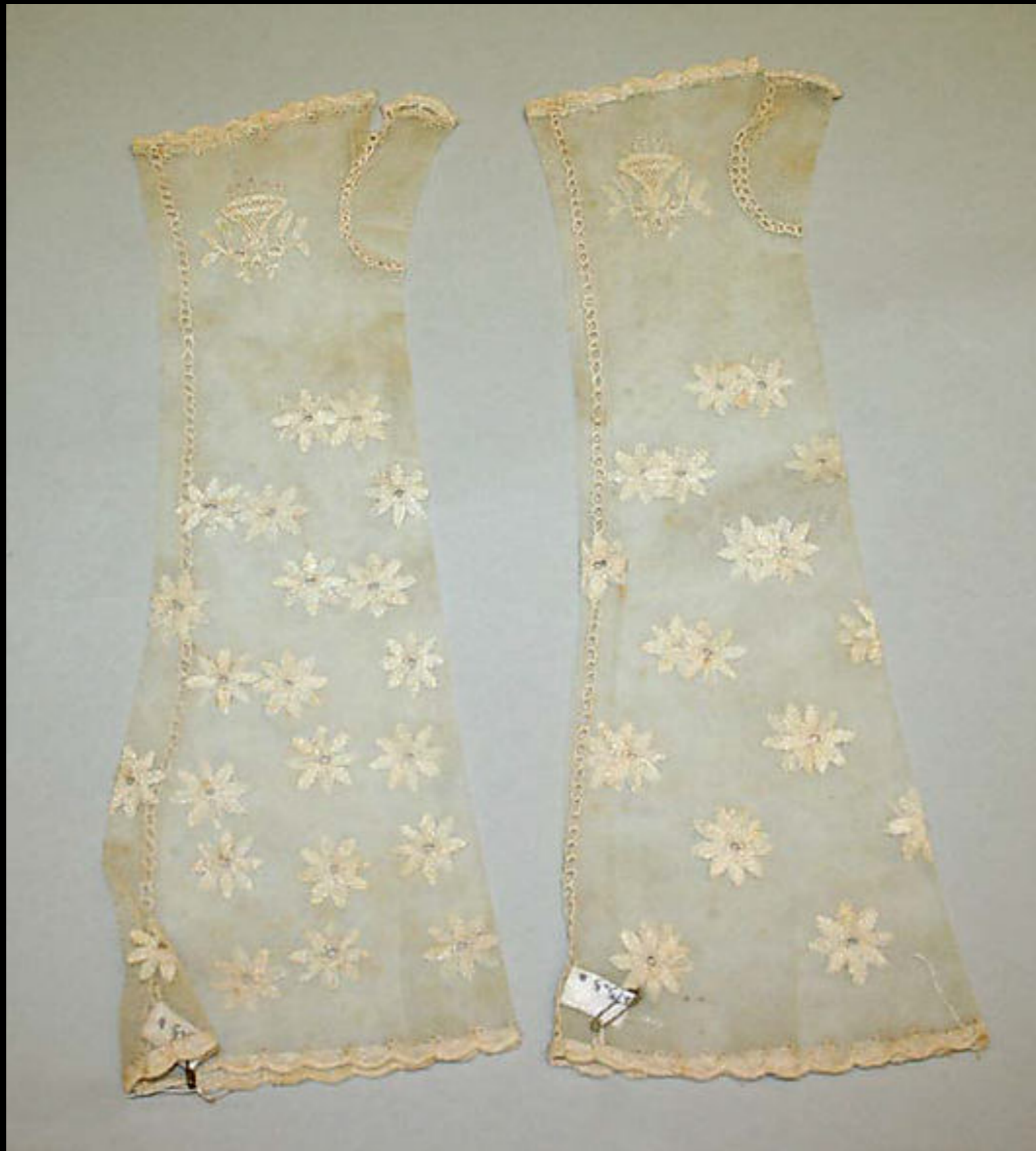
English Cotton Mitts Late 18th Century (Metropolitan Museum of Art)