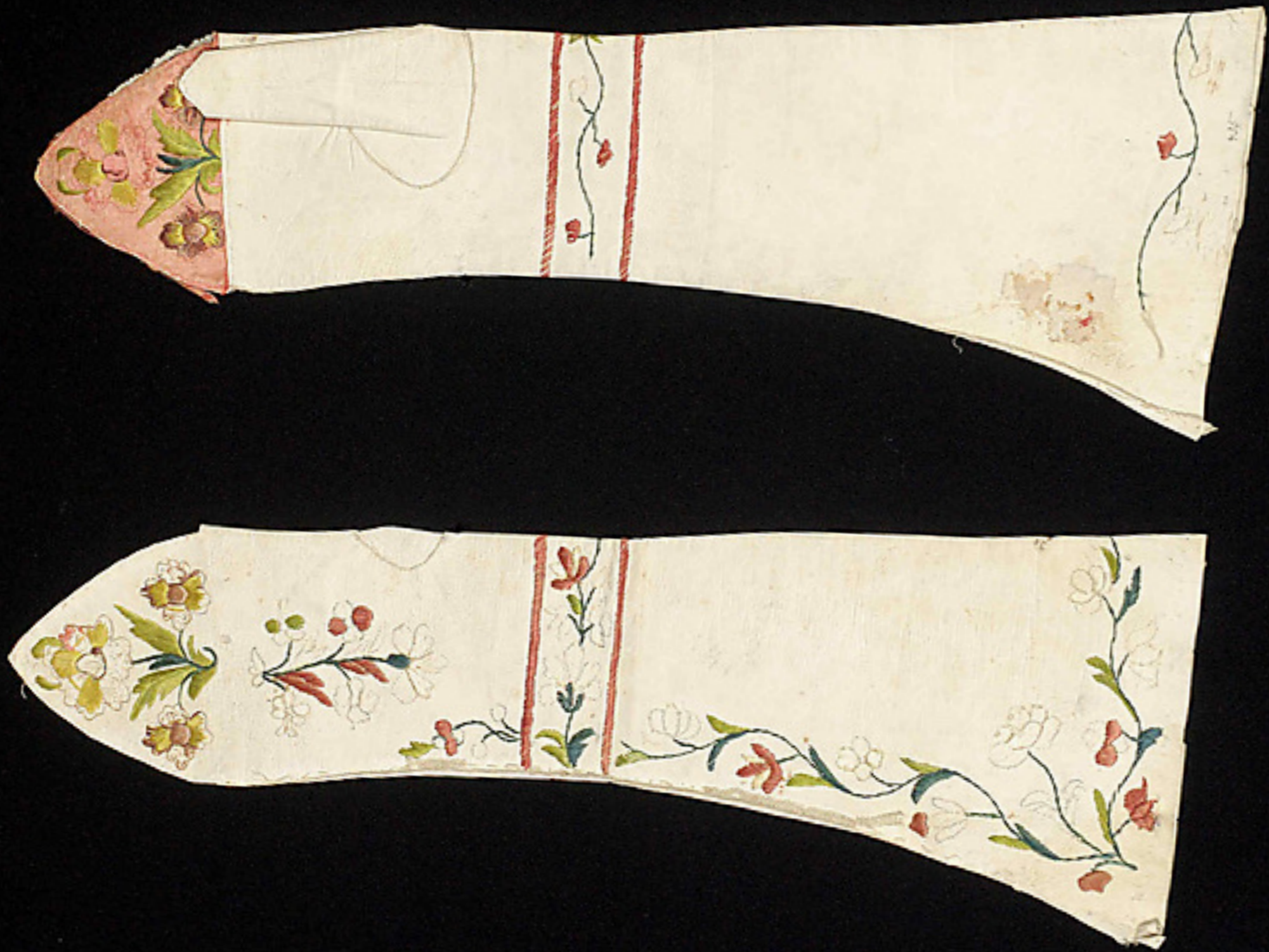
English Silk & Leather Mitts c. 1775 (Metropolitan Museum of Art)