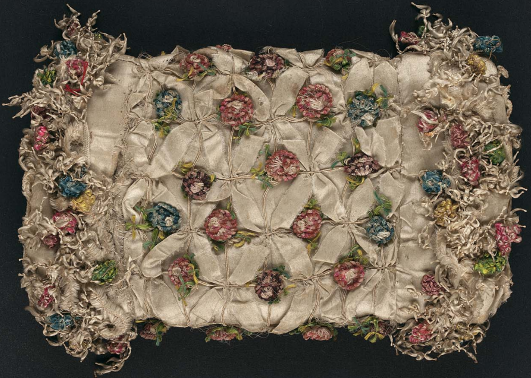
French Silk Muff c. 1774 - 1790 (Metropolitan Museum of Art)