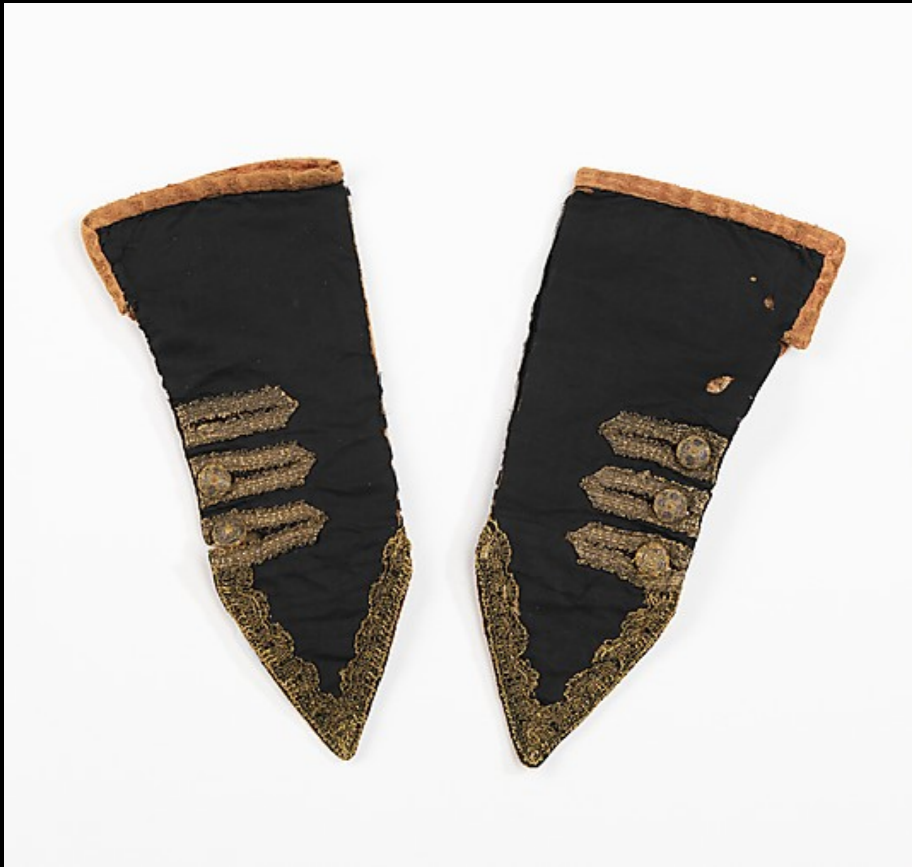
English Silk, Cotton & Metallic Mitts c. 1680 - 1720 (Metropolitan Museum of Art)