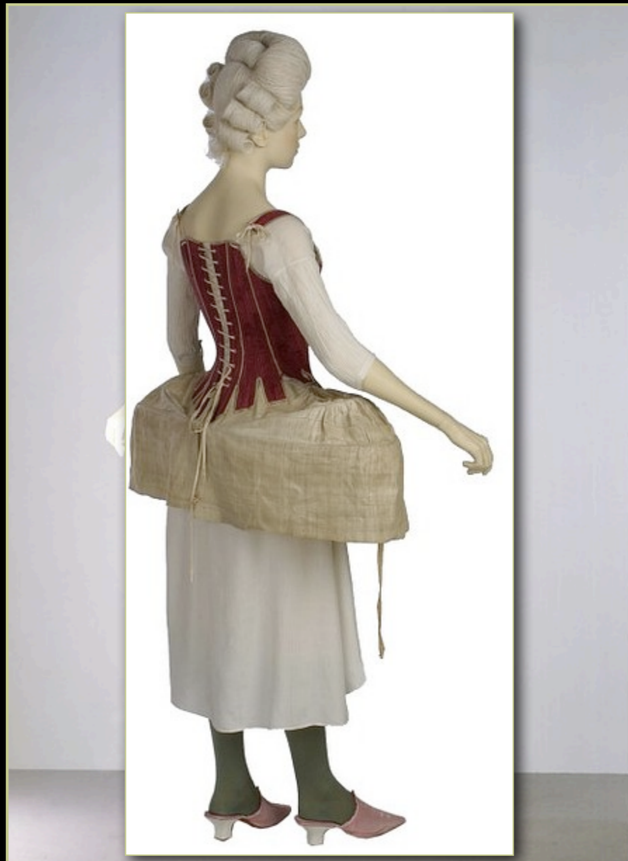
English Stays & Panniere c. 1770 - 1790 (Victoria & Albert Museum)