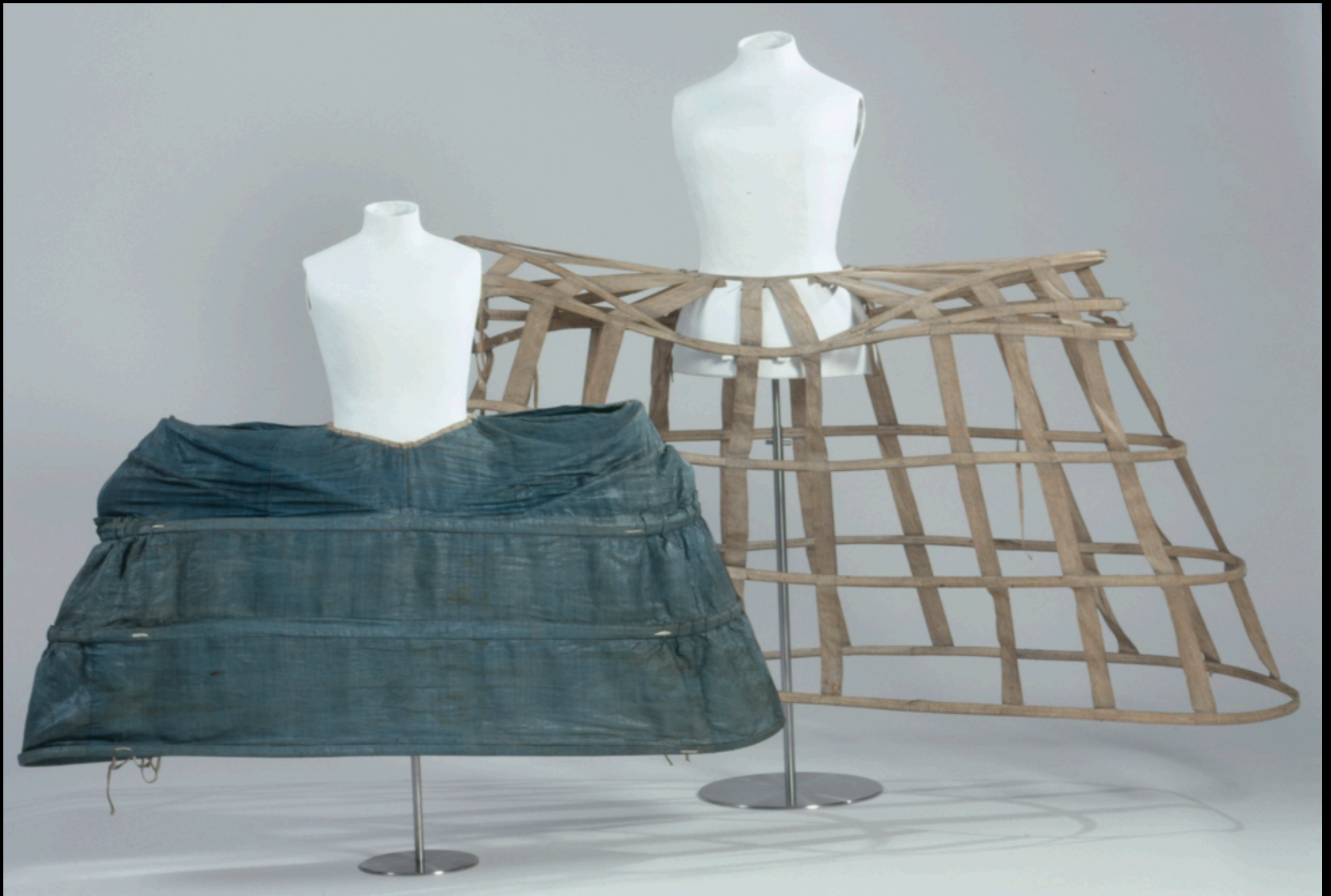
German Paniers c. 1760 (German National Museum)