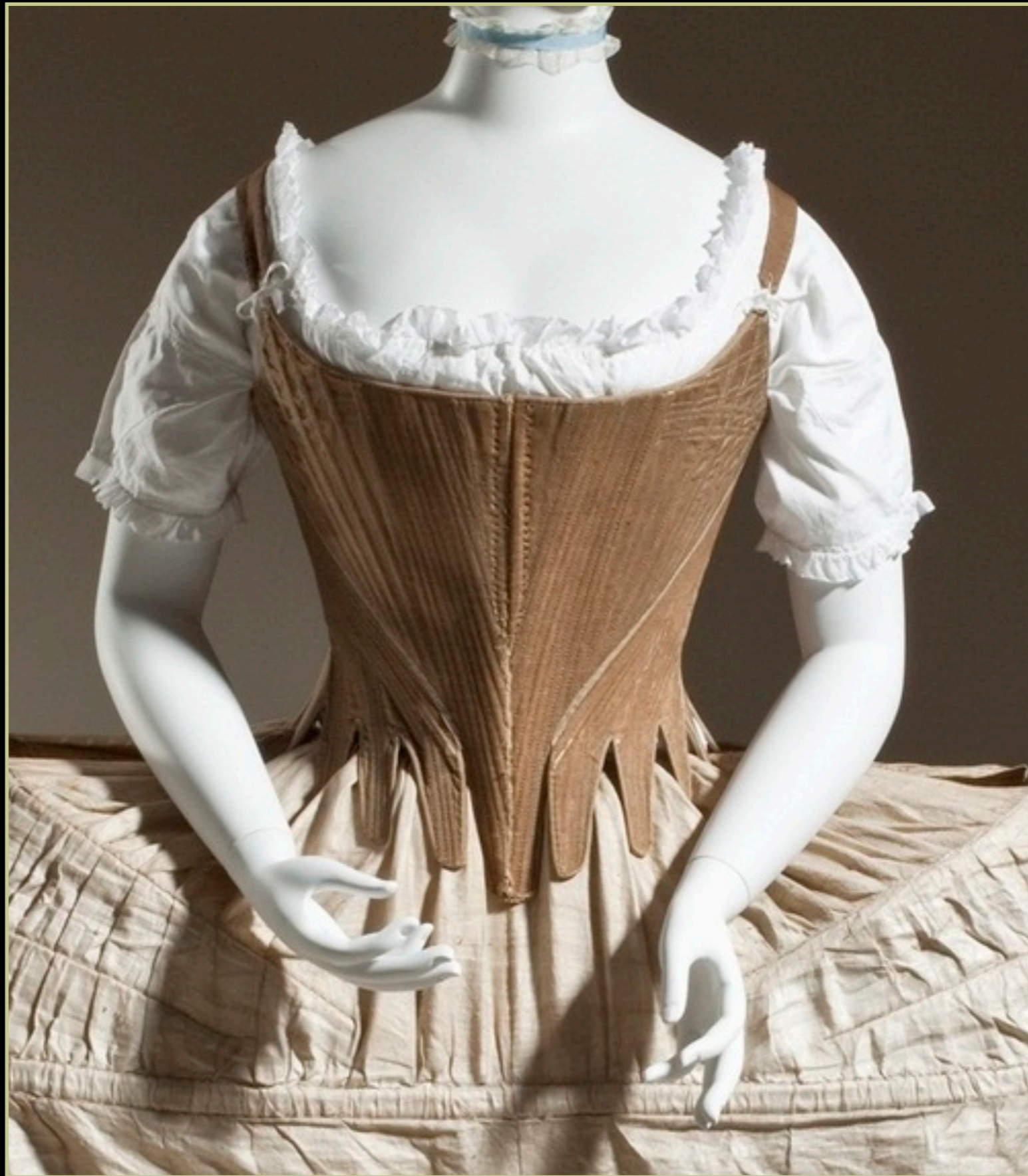
English Chemise, Bodice & Panniers c. 1780