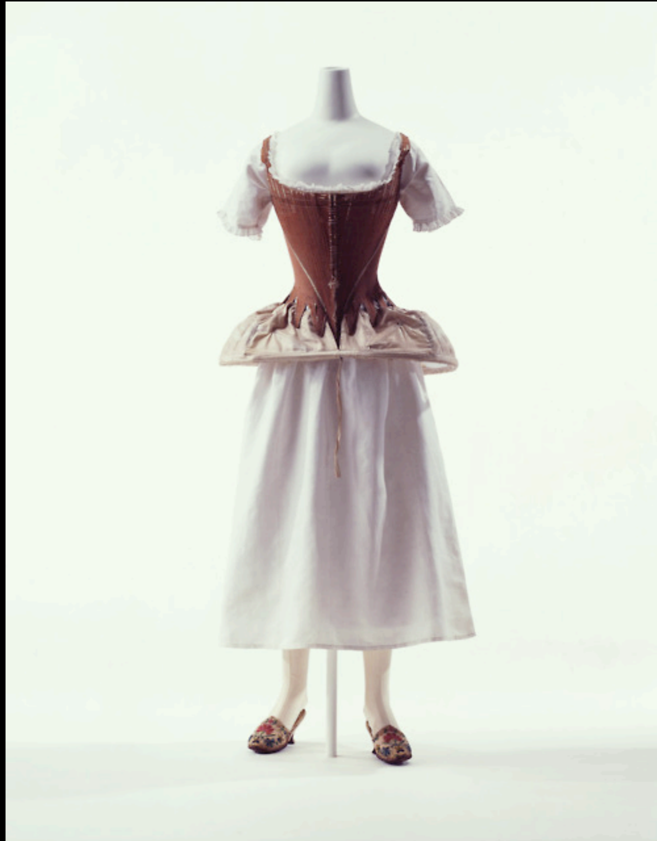
English Stays & Pannier