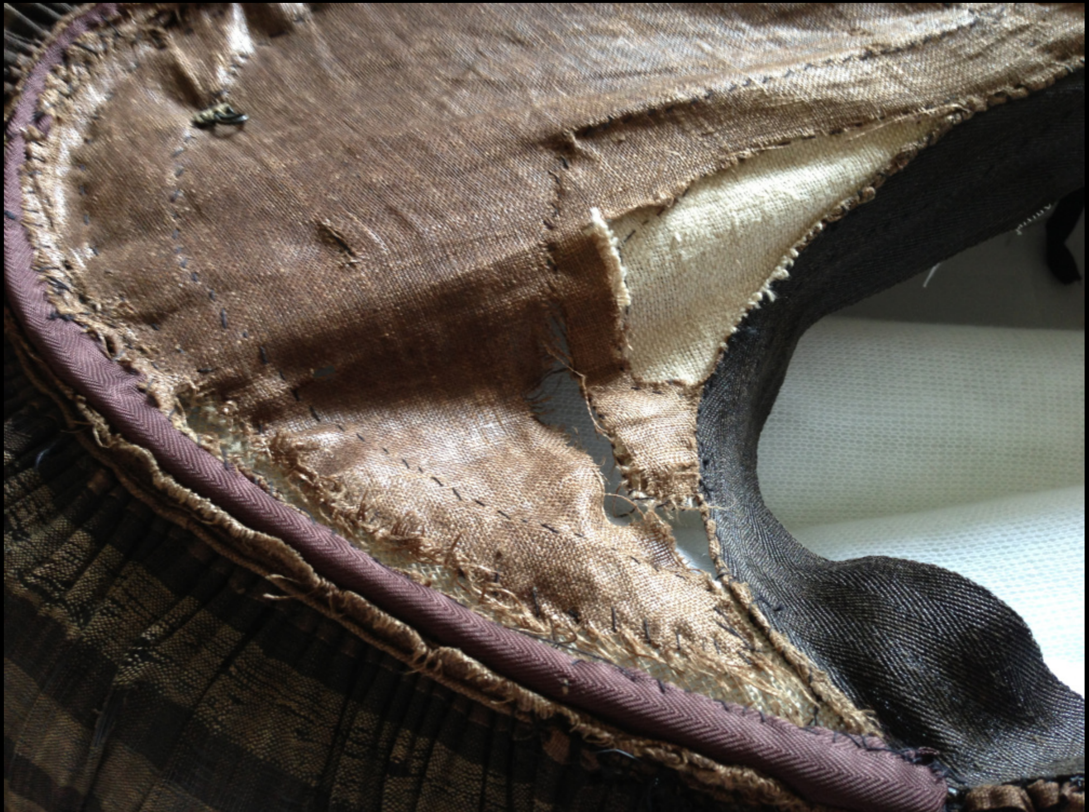
English Side Hoops Linen, Horsehair & Metal c. 1750 - 1760 (Snowhill Wade Costume Collection, Gloucestershire)