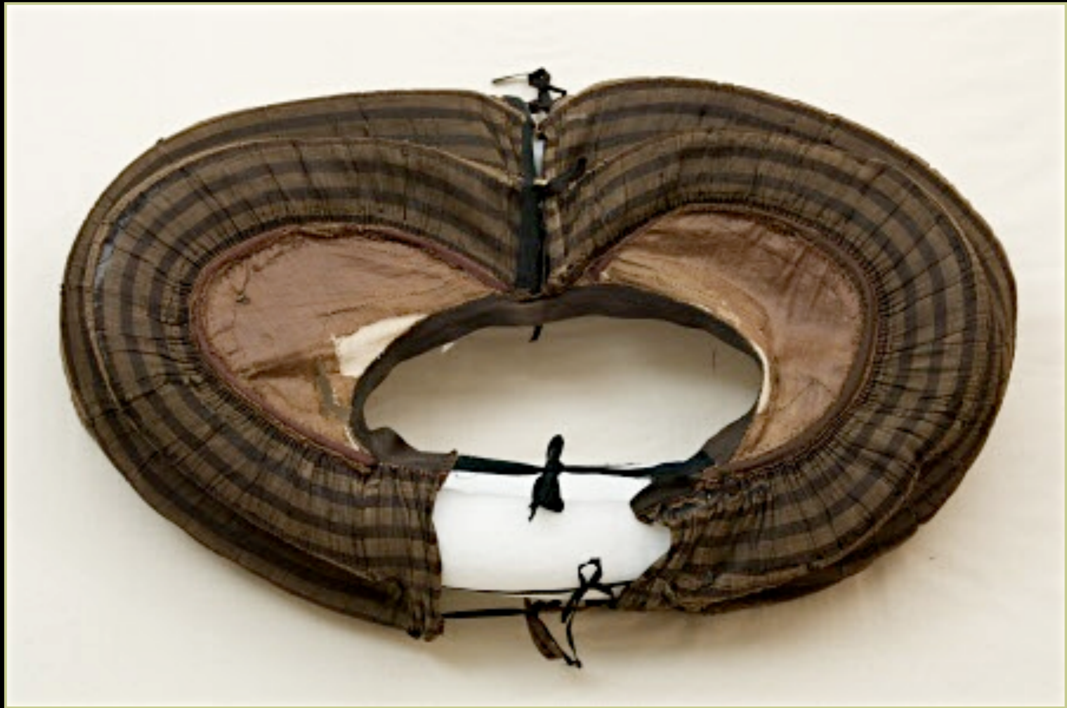
English Side Hoops Linen, Horsehair & Metal c. 1750 - 1760 (Snowhill Wade Costume Collection, Gloucestershire)