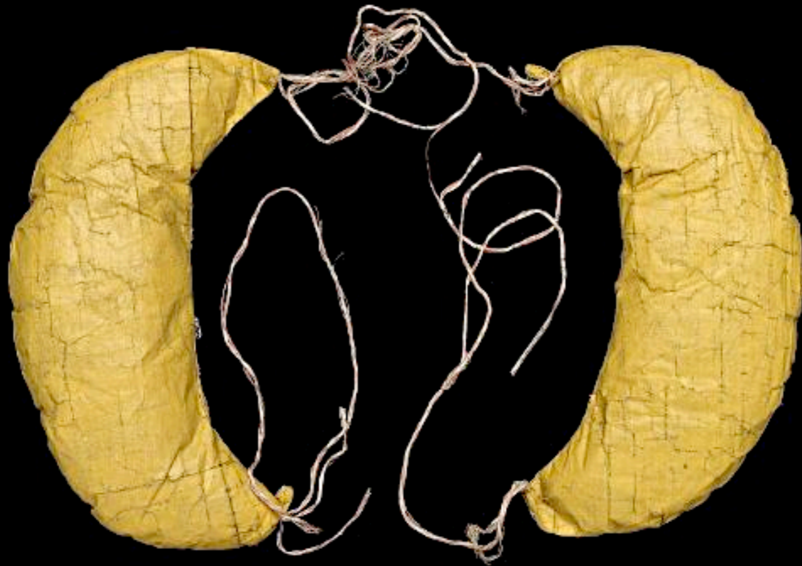
Glazed Cotton or Wool Hip Rolls Wood Shavings Stuffing Late 18th Century (Museum of Fine Arts, Boston)