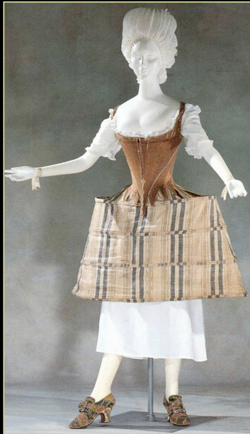
English Stays & Panniers c. 1775 (Kyoto Costume Institute)