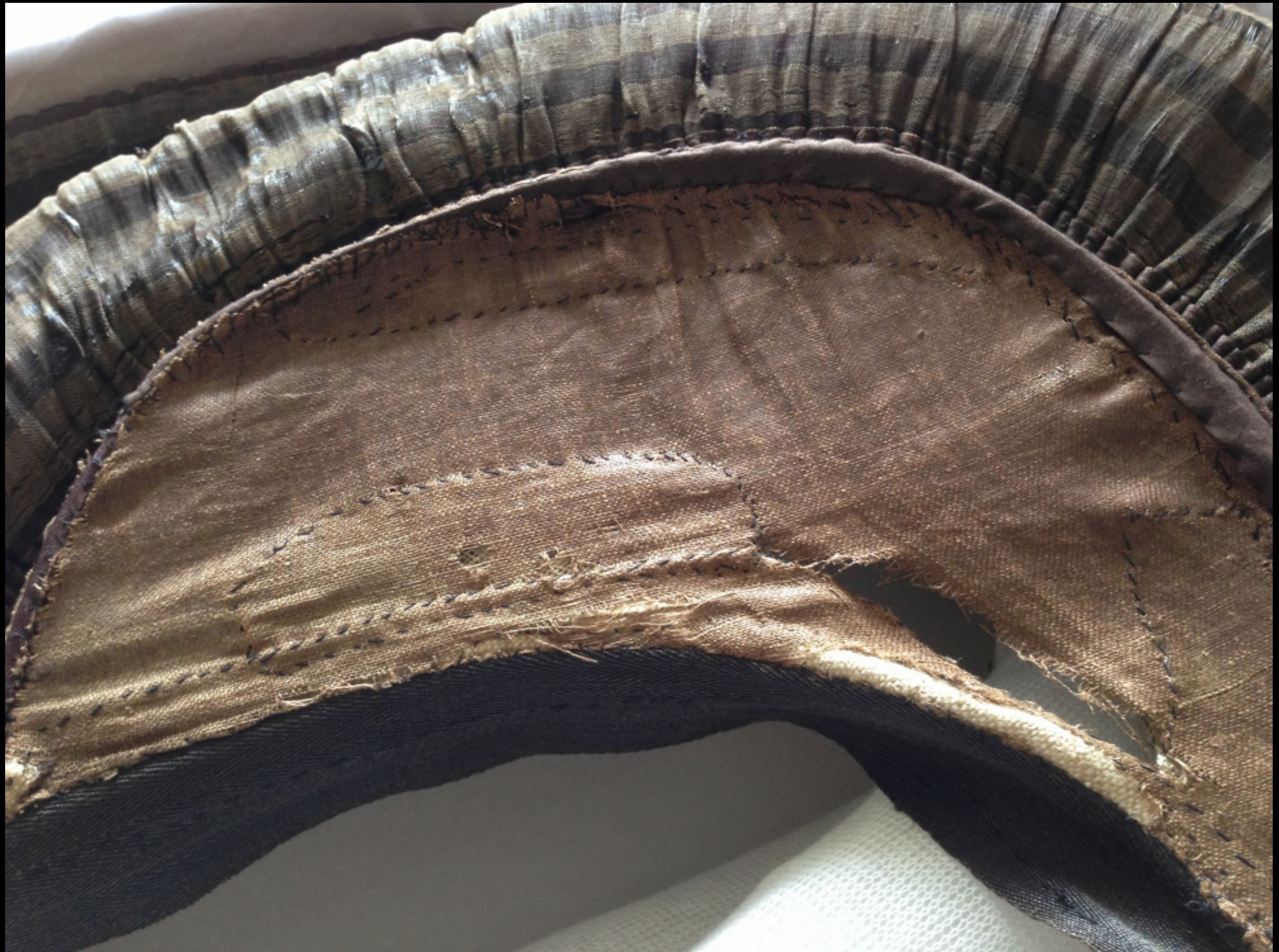
English Side Hoops Linen, Horsehair & Metal c. 1750 - 1760 (Snowhill Wade Costume Collection, Gloucestershire)