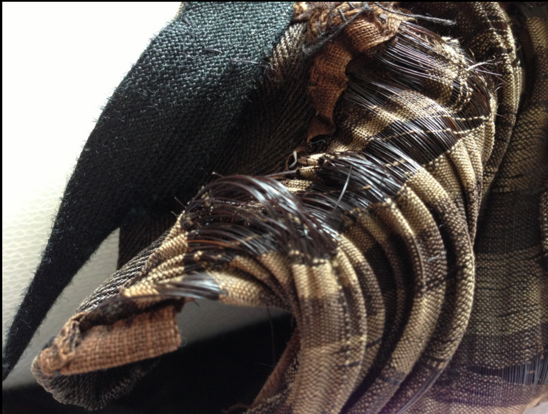
English Side Hoops Linen, Horsehair & Metal c. 1750 - 1760 (Snowhill Wade Costume Collection, Gloucestershire)