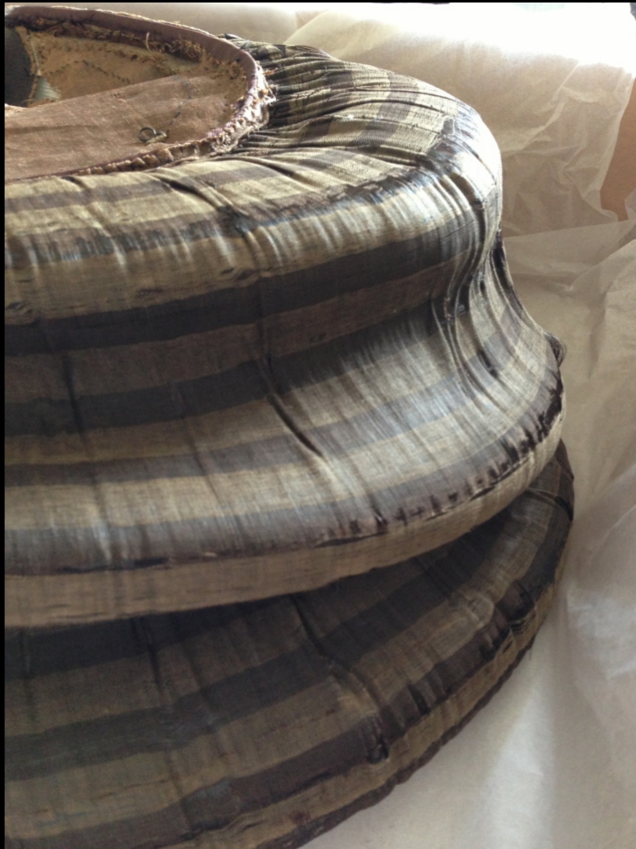
English Side Hoops Linen, Horsehair & Metal c. 1750 - 1760 (Snowhill Wade Costume Collection, Gloucestershire)