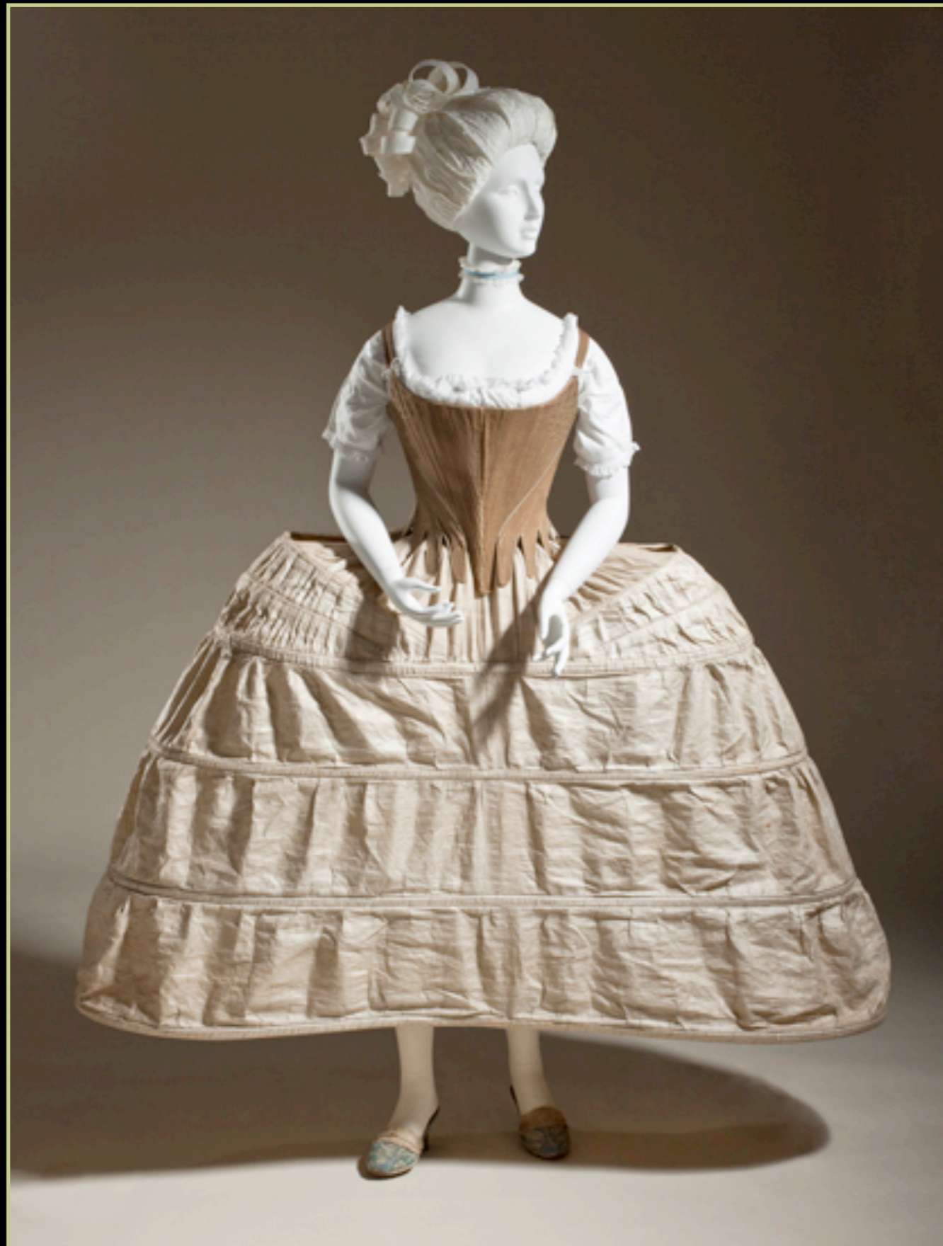
English Chemise, Bodice & Panniers c. 1780