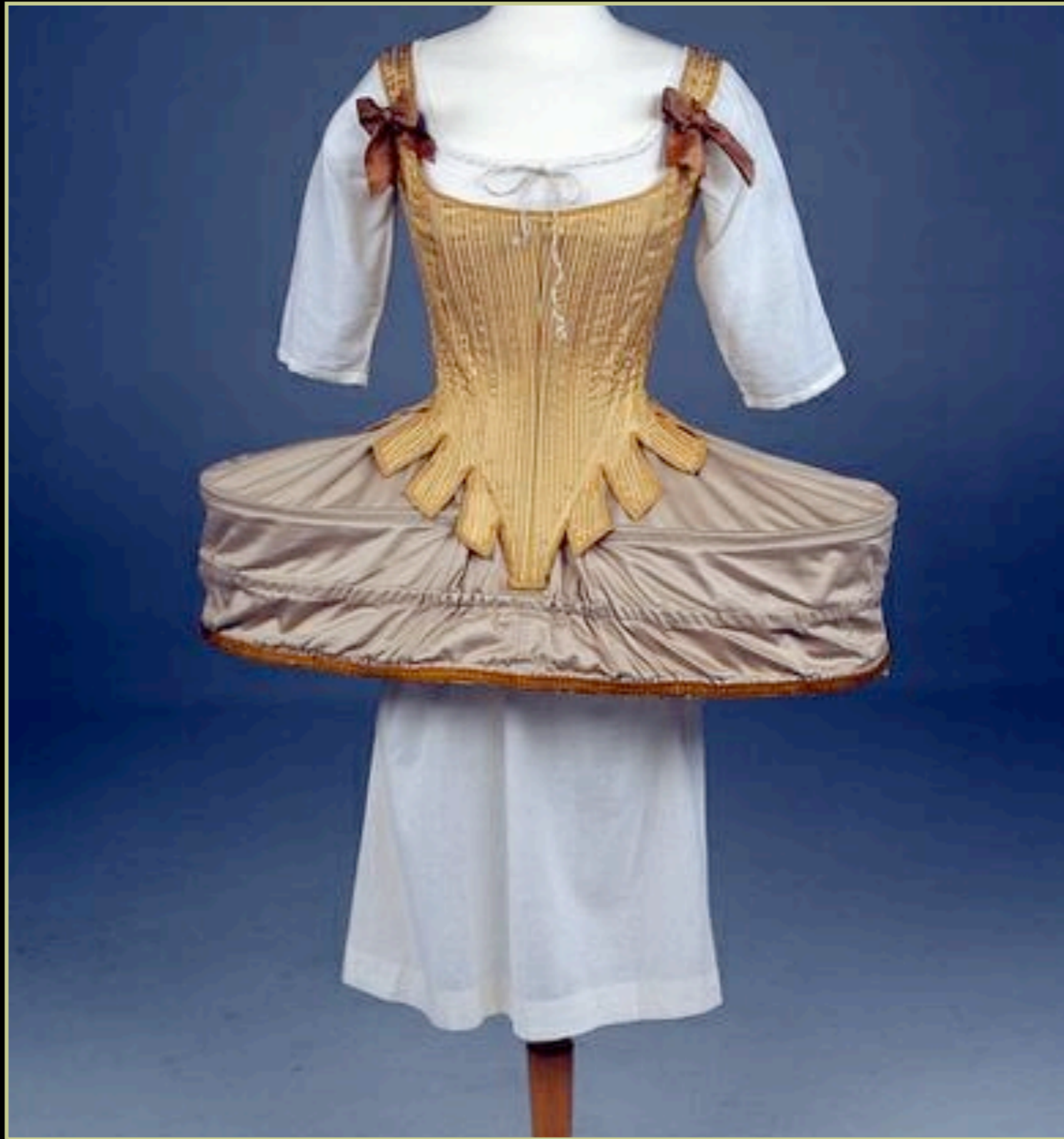
English Stays & Panniere c. 1770 (Louisiana Art & Science Museum)