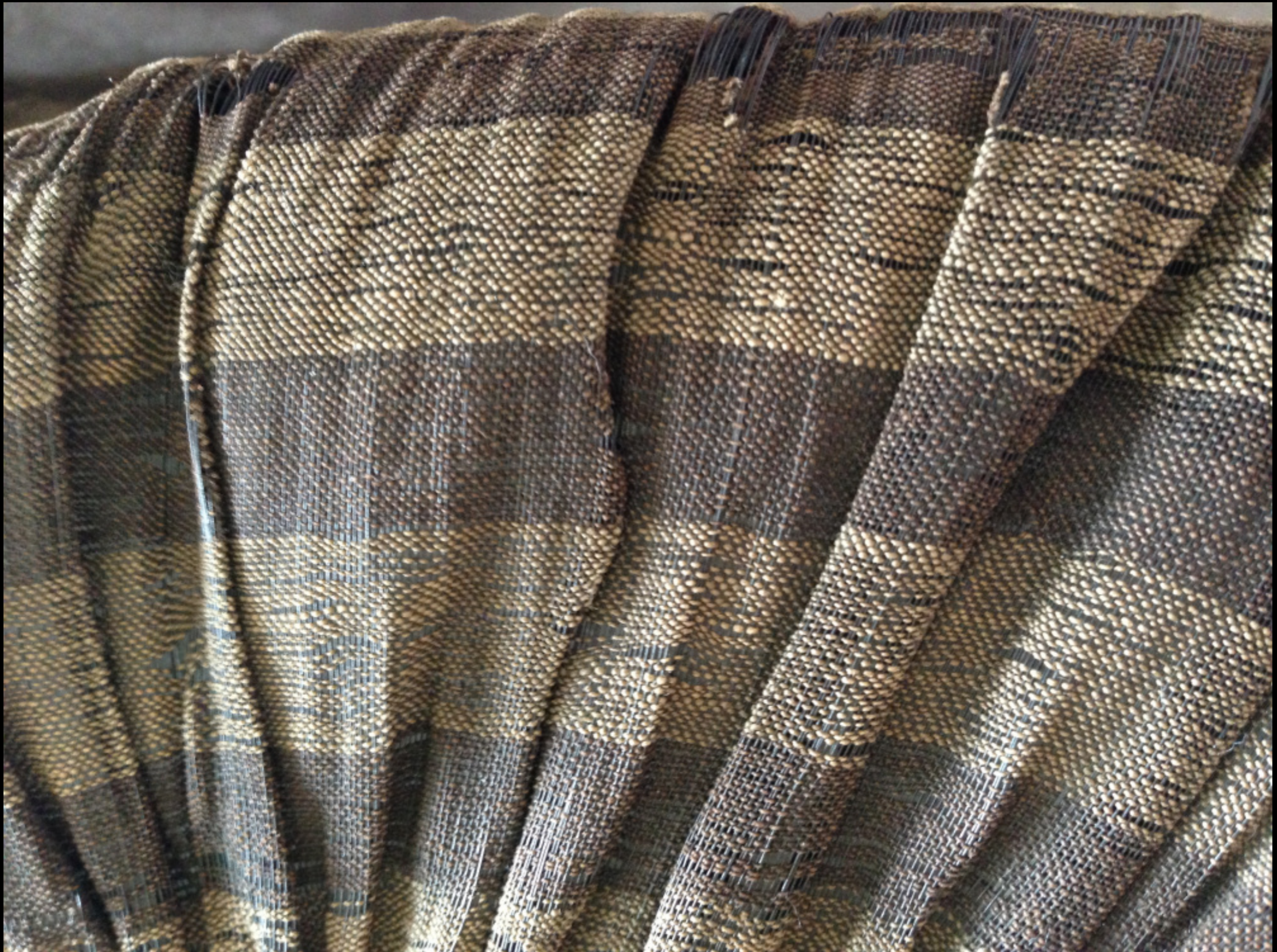
English Side Hoops Linen, Horsehair & Metal c. 1750 - 1760 (Snowhill Wade Costume Collection, Gloucestershire)