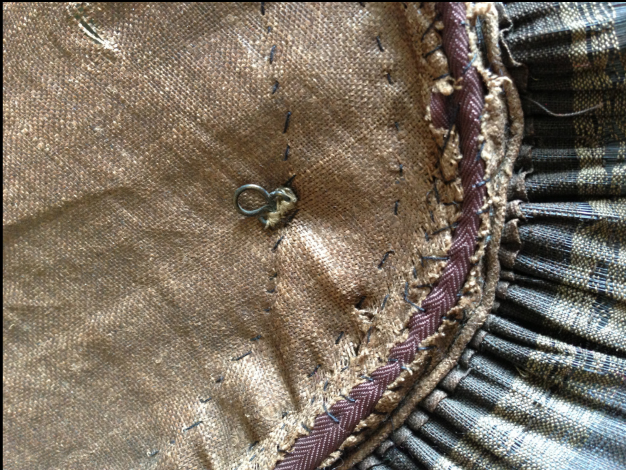
English Side Hoops Linen, Horsehair & Metal c. 1750 - 1760 (Snowhill Wade Costume Collection, Gloucestershire)