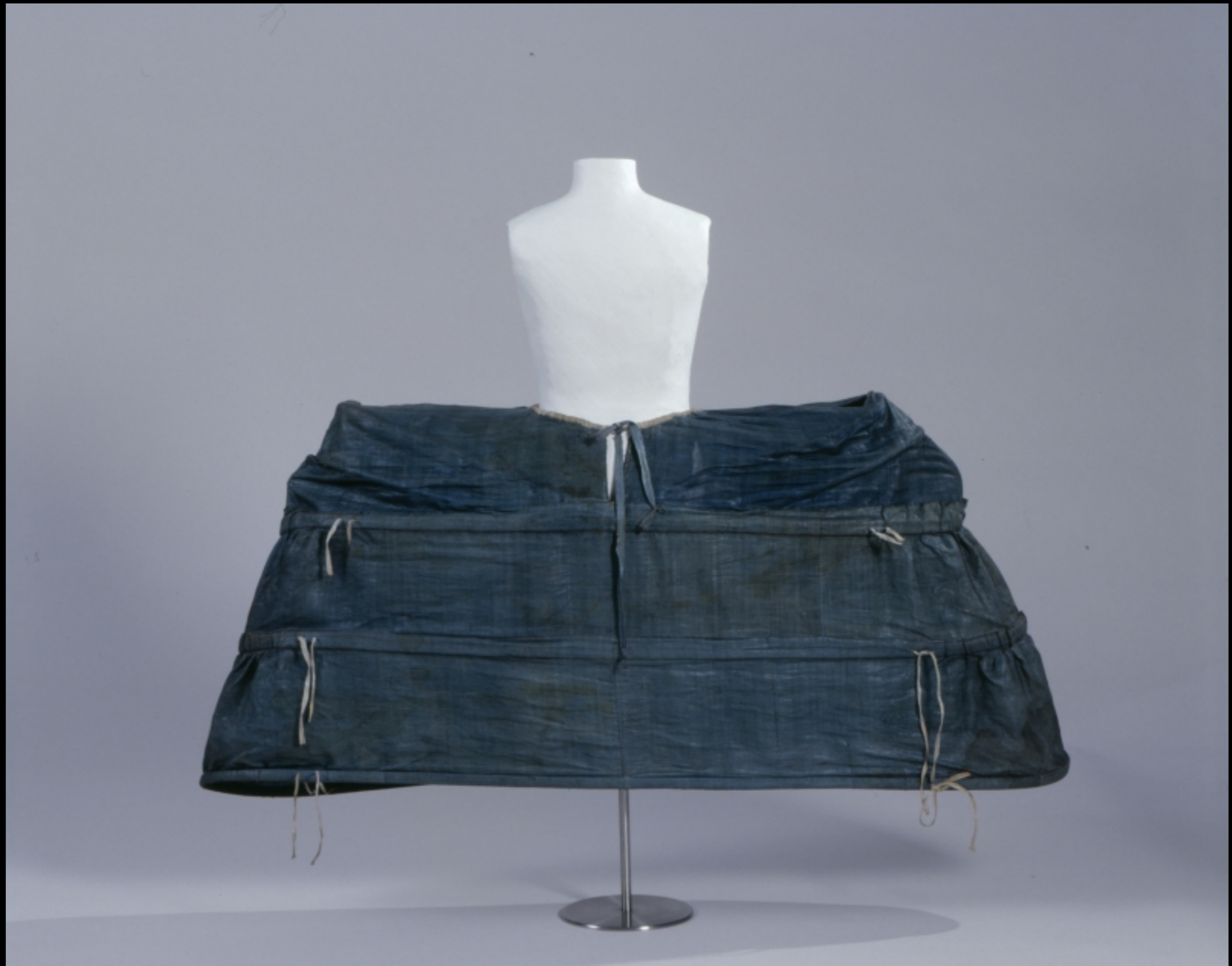
German Paniers c. 1760 (German National Museum)