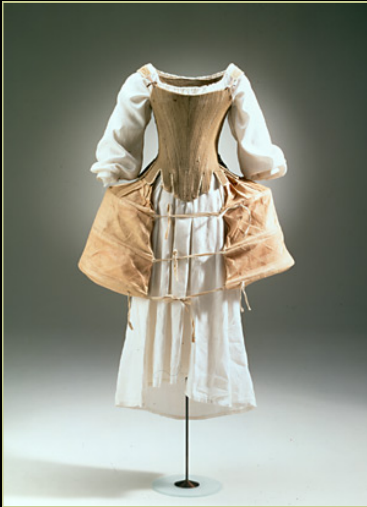
Chemise, Bodice & Panniers 18th Century