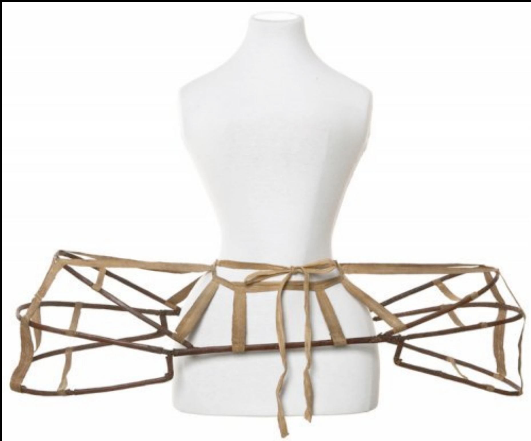
French Paniers à charnières c. 1775 - 1780 (Les Arts Décoratifs)