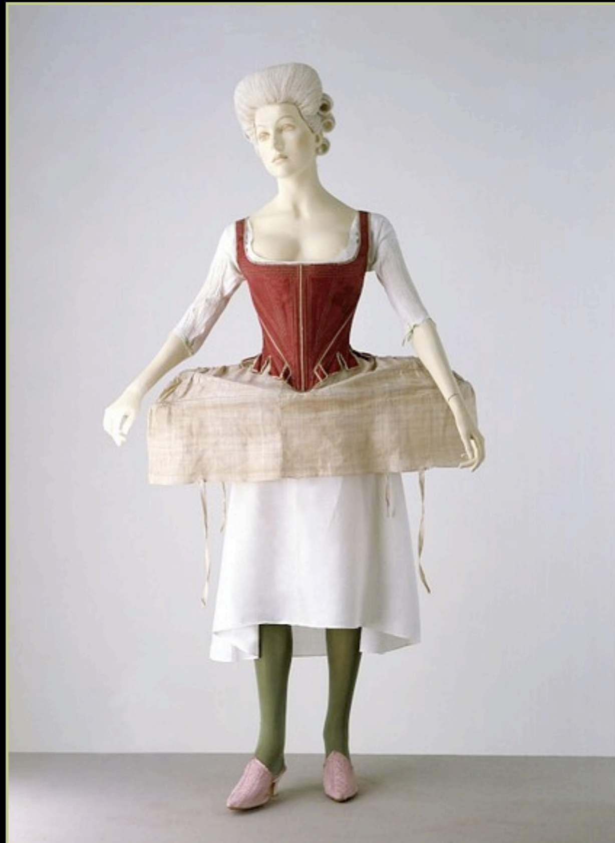
English Stays & Panniere c. 1770 - 1790 (Victoria & Albert Museum)