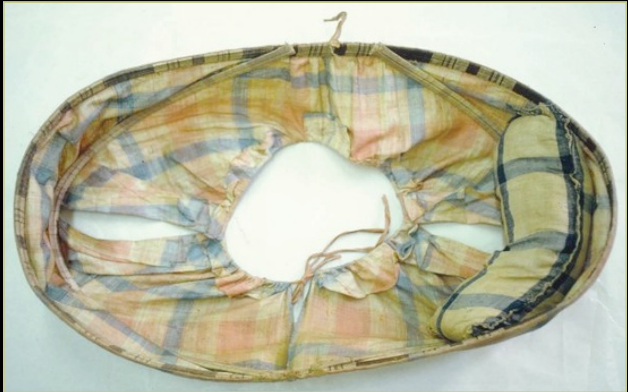
Underside of a Panniere c. 1760 (Westminster Abbey)