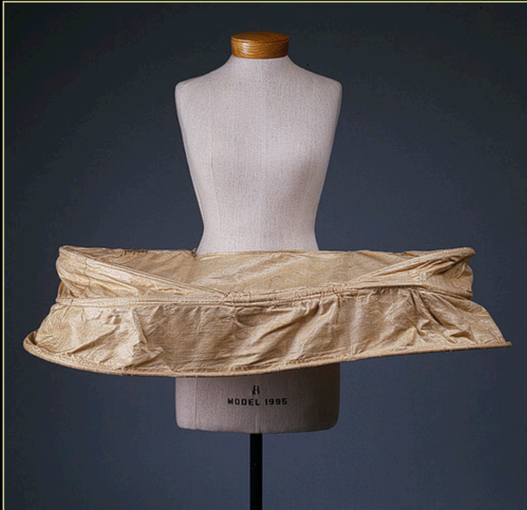
English Linen and Baleen Panniers c. 1750 (Metropolitan Museum of Art)