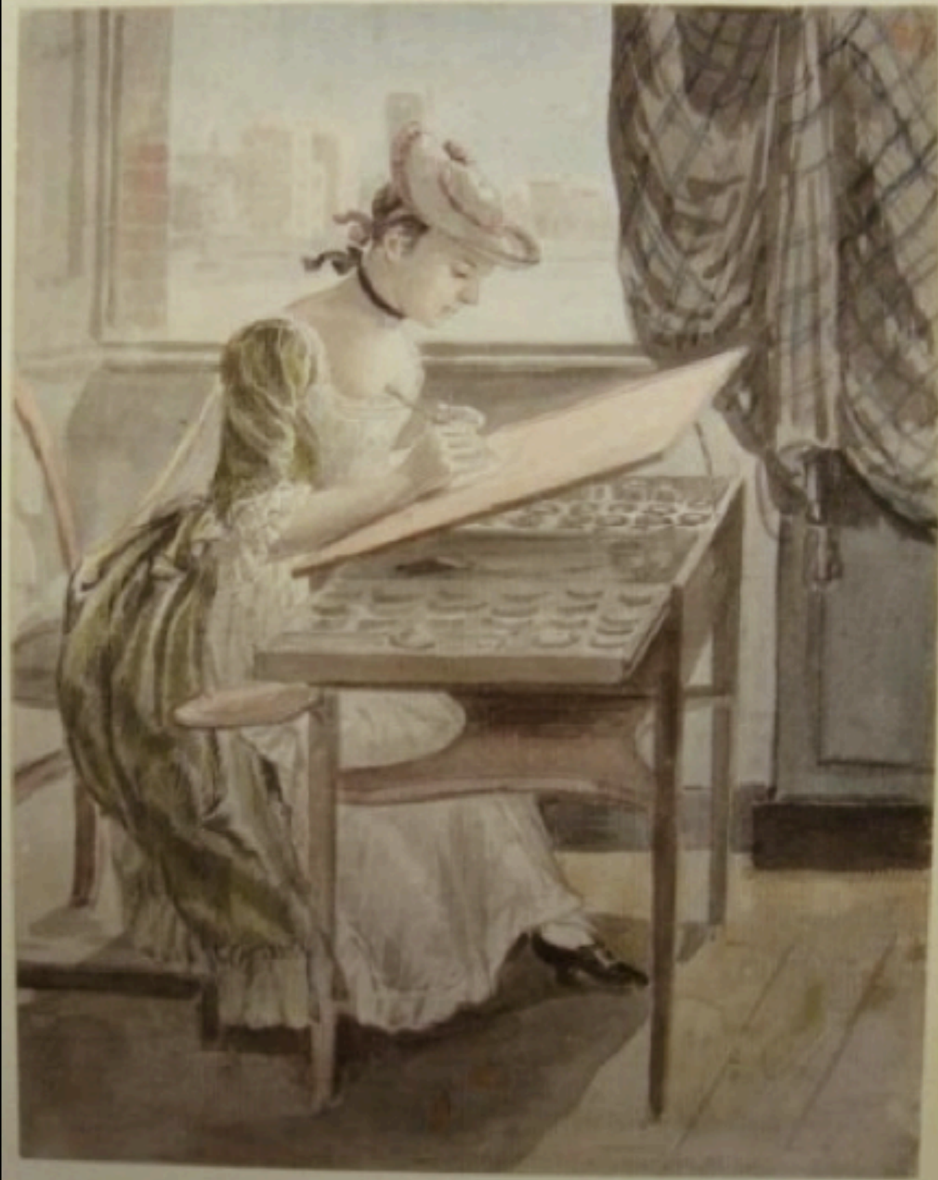
A Young Lady Writing Paul Sandby (The Royal Collection)