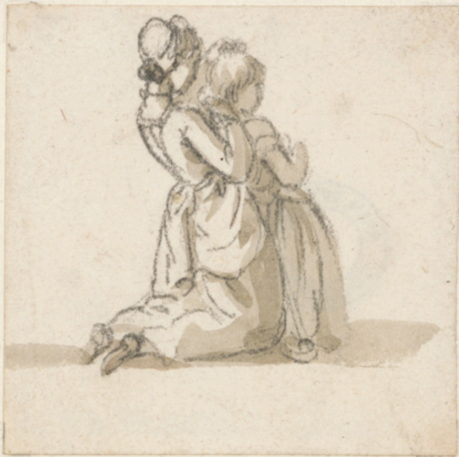
"The Toilet" Paul Sandby