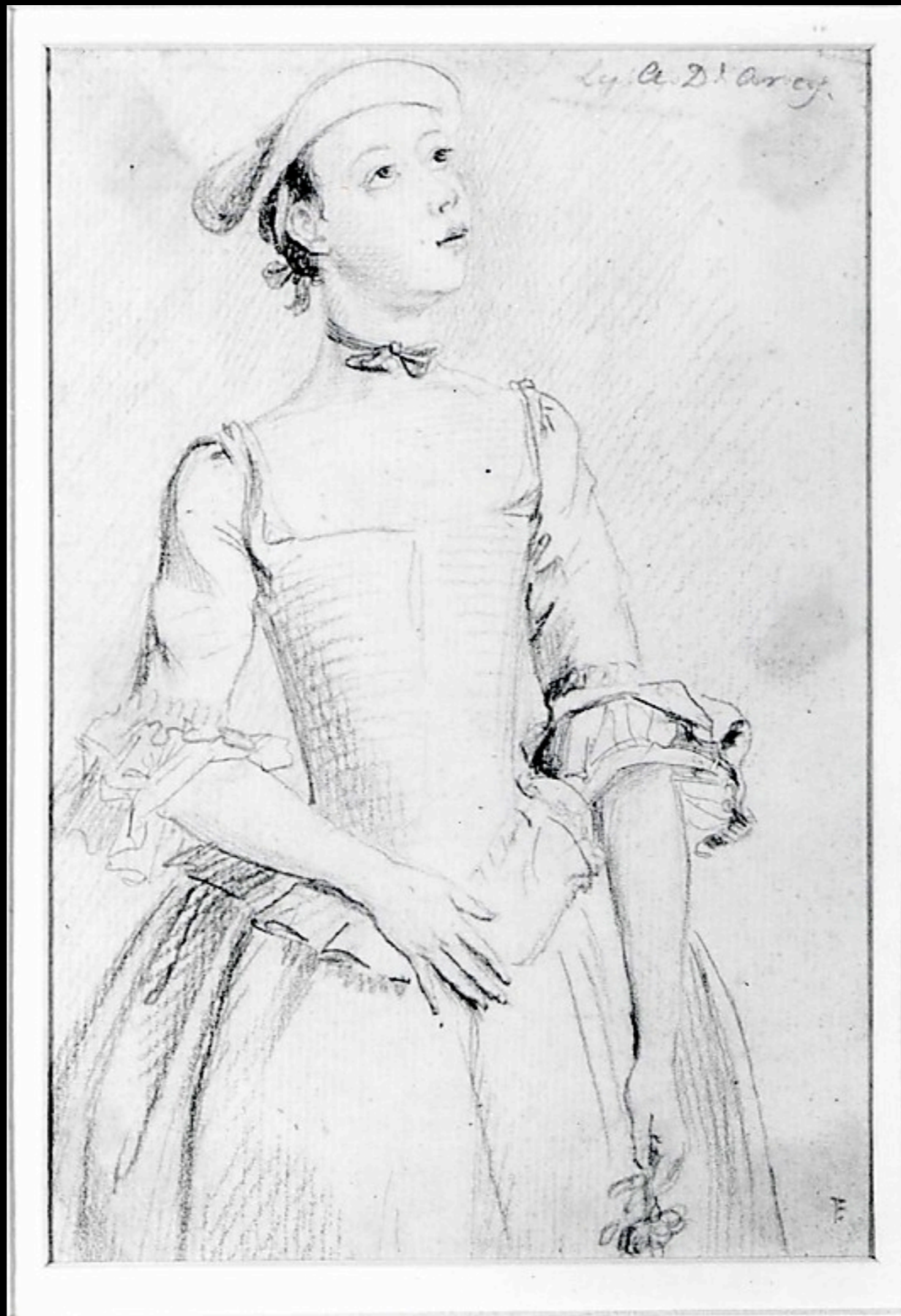
Lady Amelia D'Arcy by Paul Sandby c. Early 1760s (Metropolitan Museum of Art)