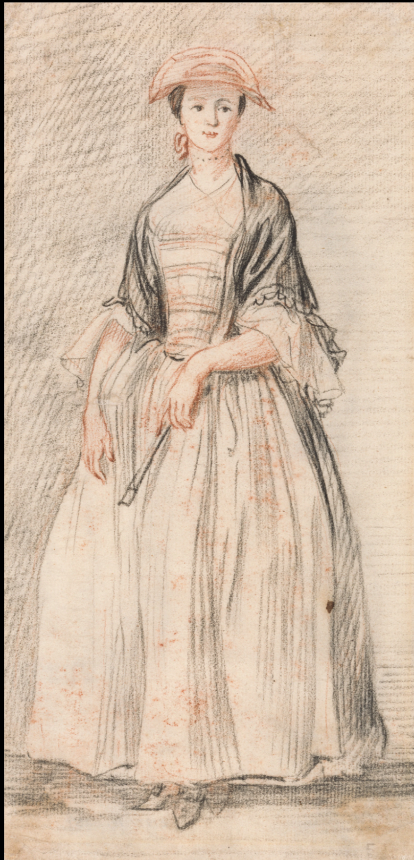
Lady with a Fan Paul Sandby c. 1760 (Yale Center for British Art)