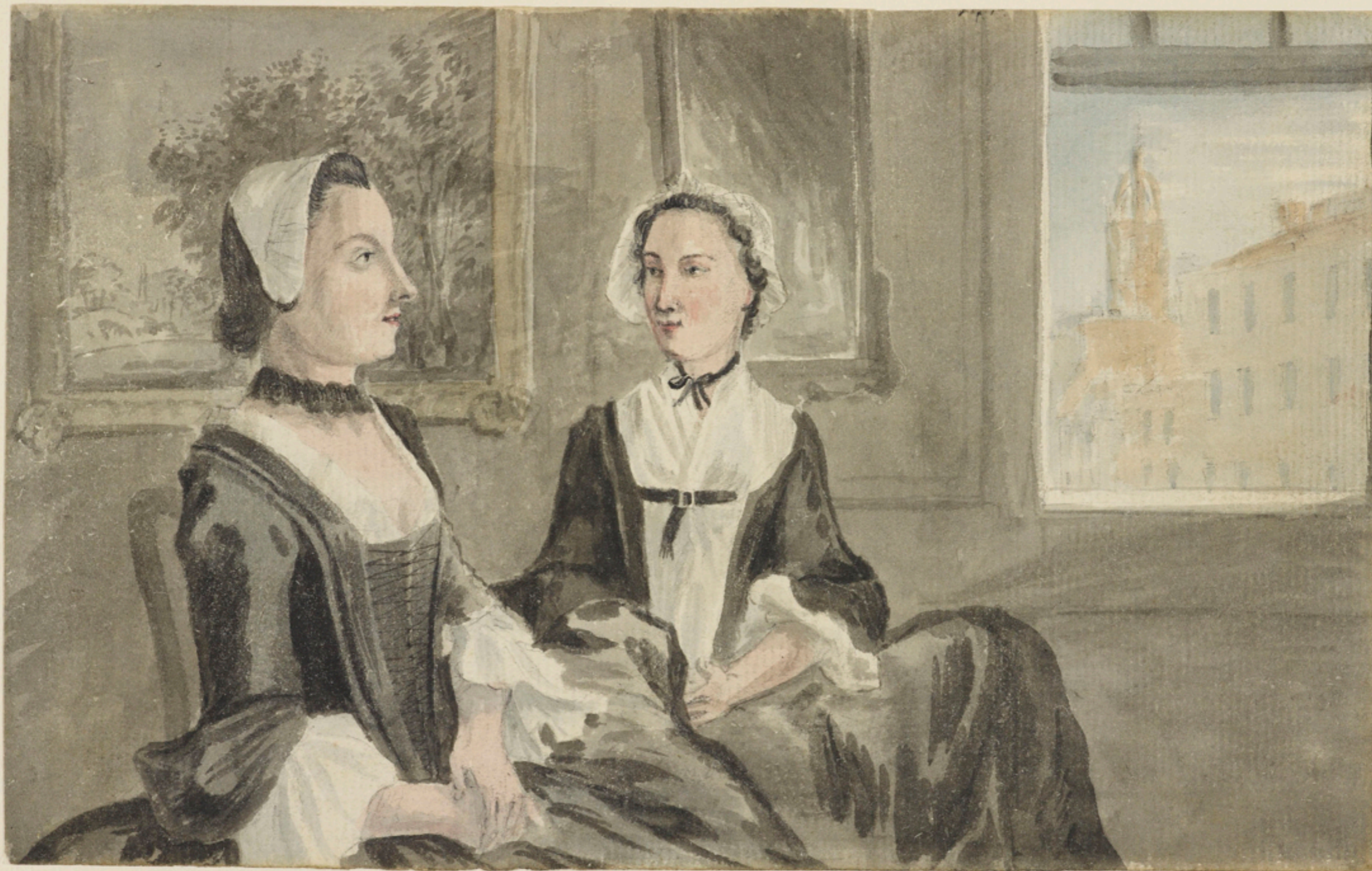
At Edinburgh by Paul Sandby c. 1750 (The Royal Collection)