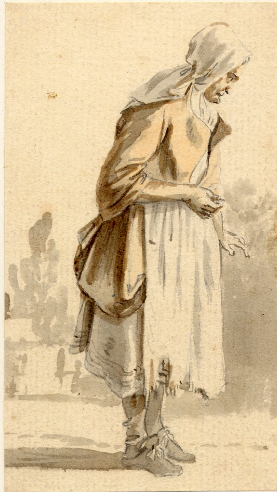
An Old Edinburgh Woman by Paul Sandby c. 1745 (The British Museum)