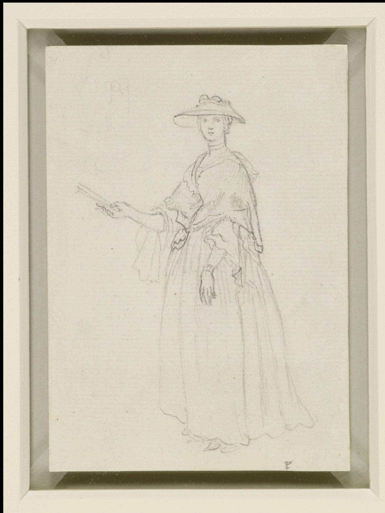
A Female Figure by Paul Sandby (The Royal Collection)