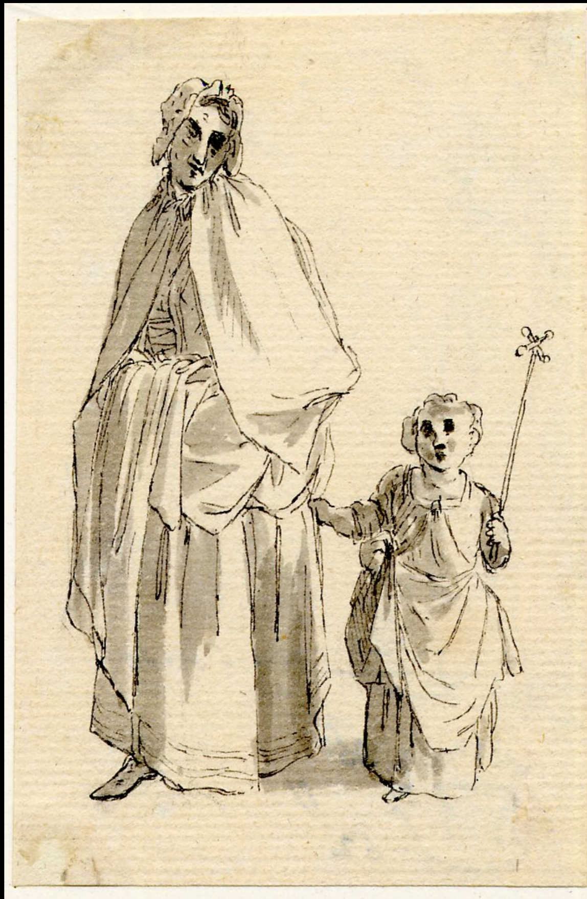
An Edinburgh Woman with Child by Paul Sandby c. 1745 (The British Museum)