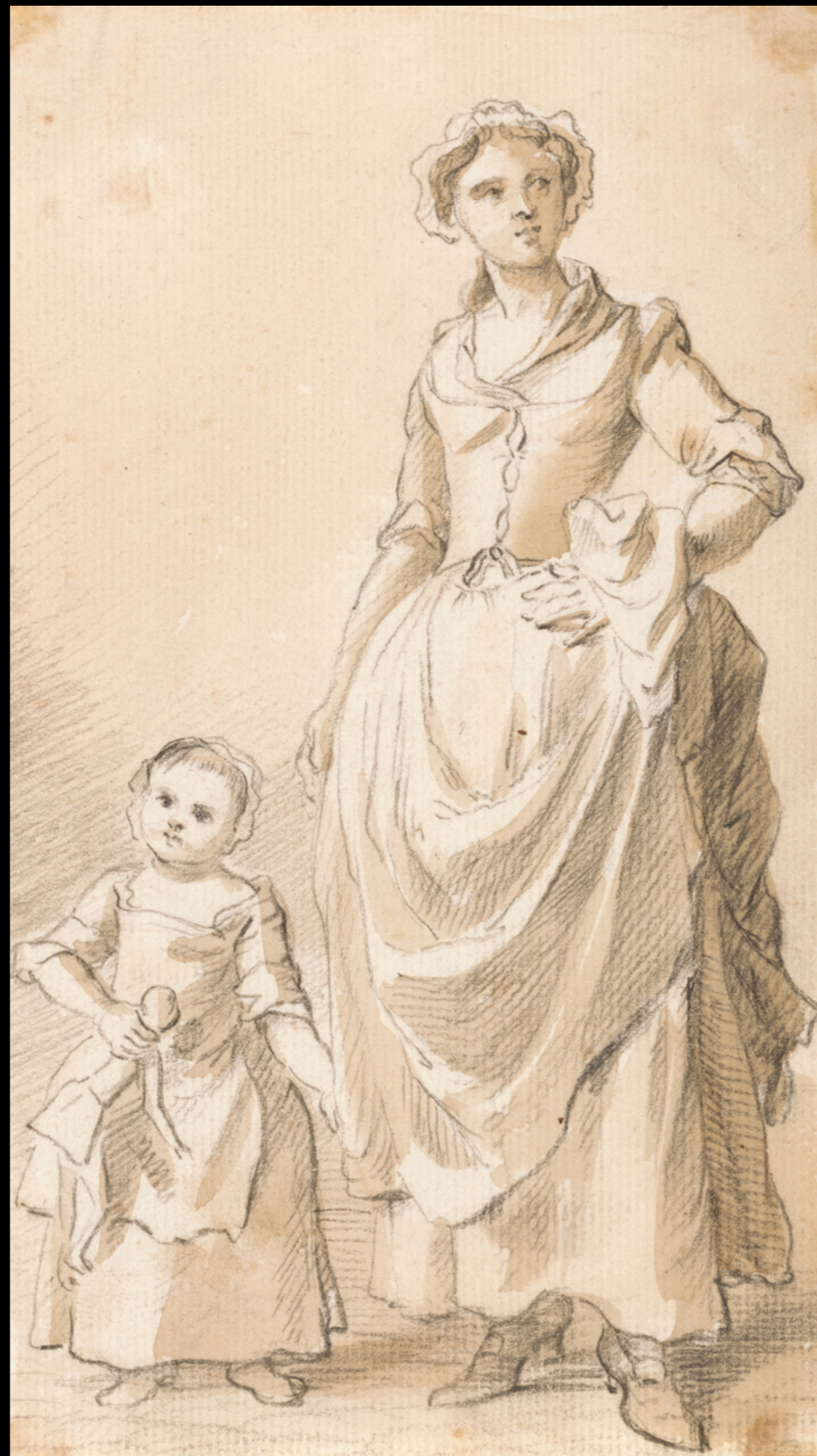
Woman and Child Holding a Doll Paul Sandby