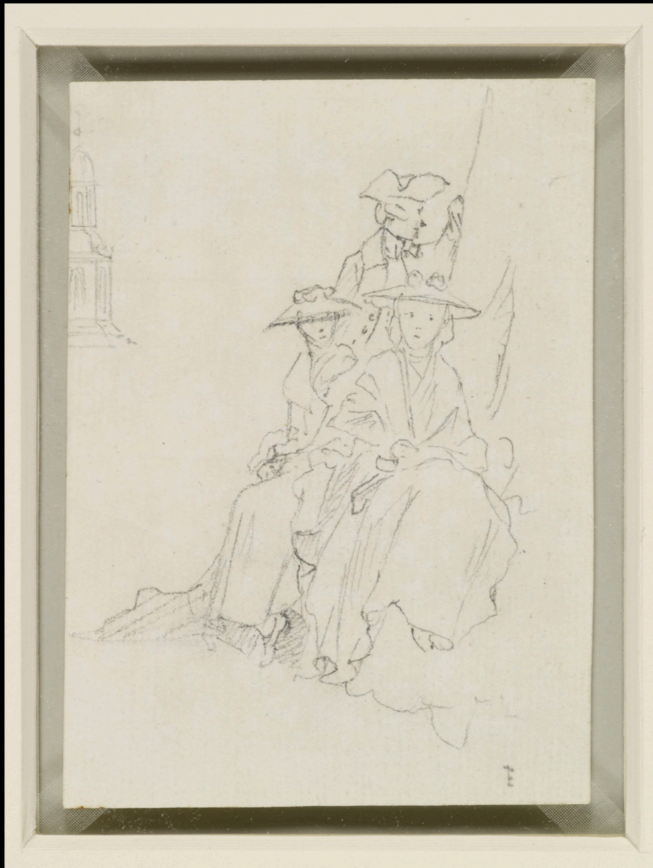
A Group of Figures by Paul Sandby c. 1780 (The Royal Collection)