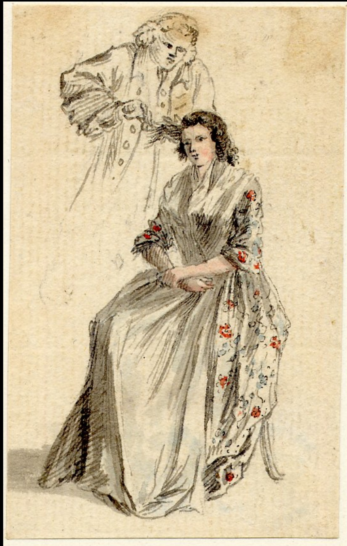
An Edinburgh Woman Having Her Hair Dressed by Paul Sandby c. 1745