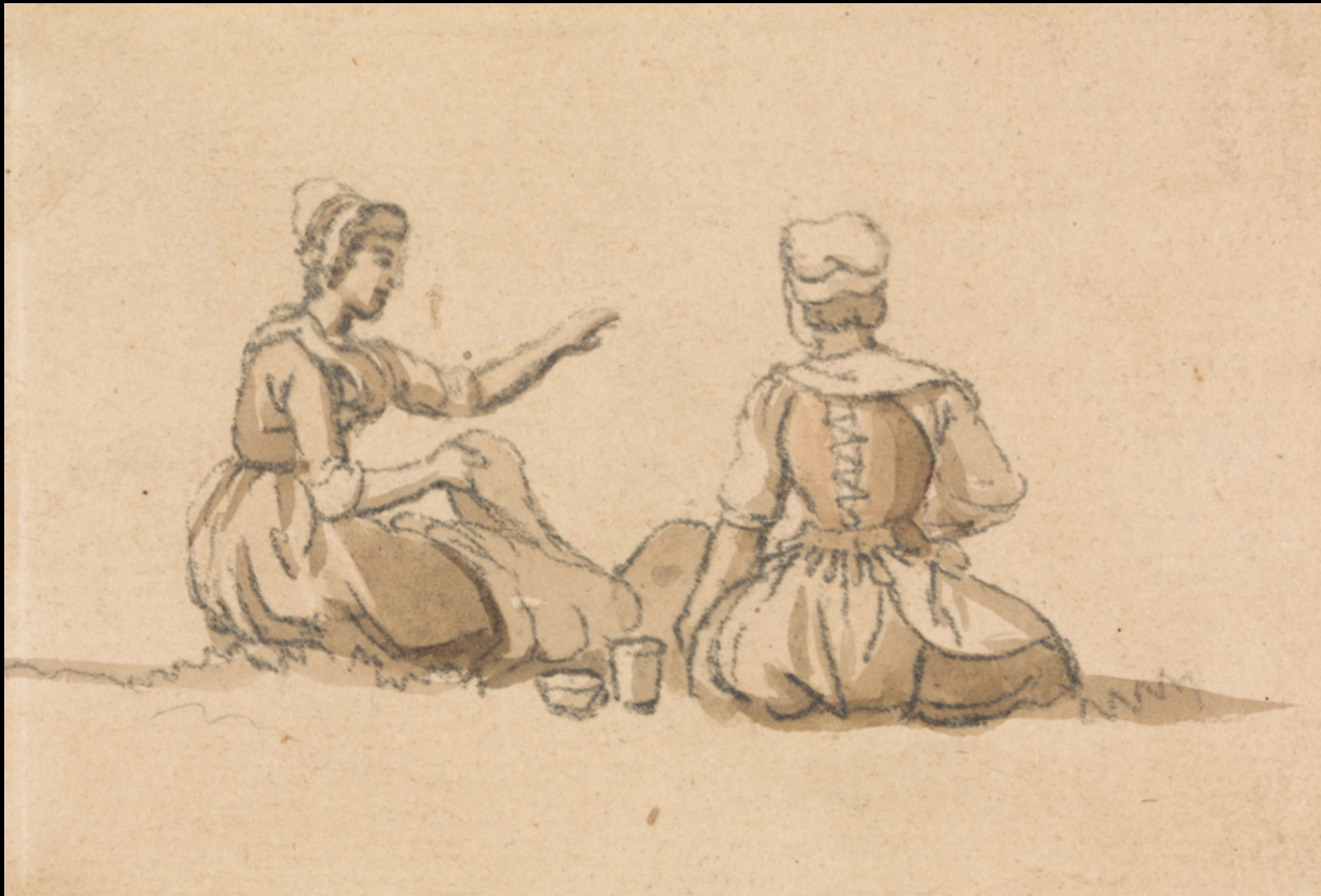
Two Girls Seated Paul Sandby (Yale Center for British Art)