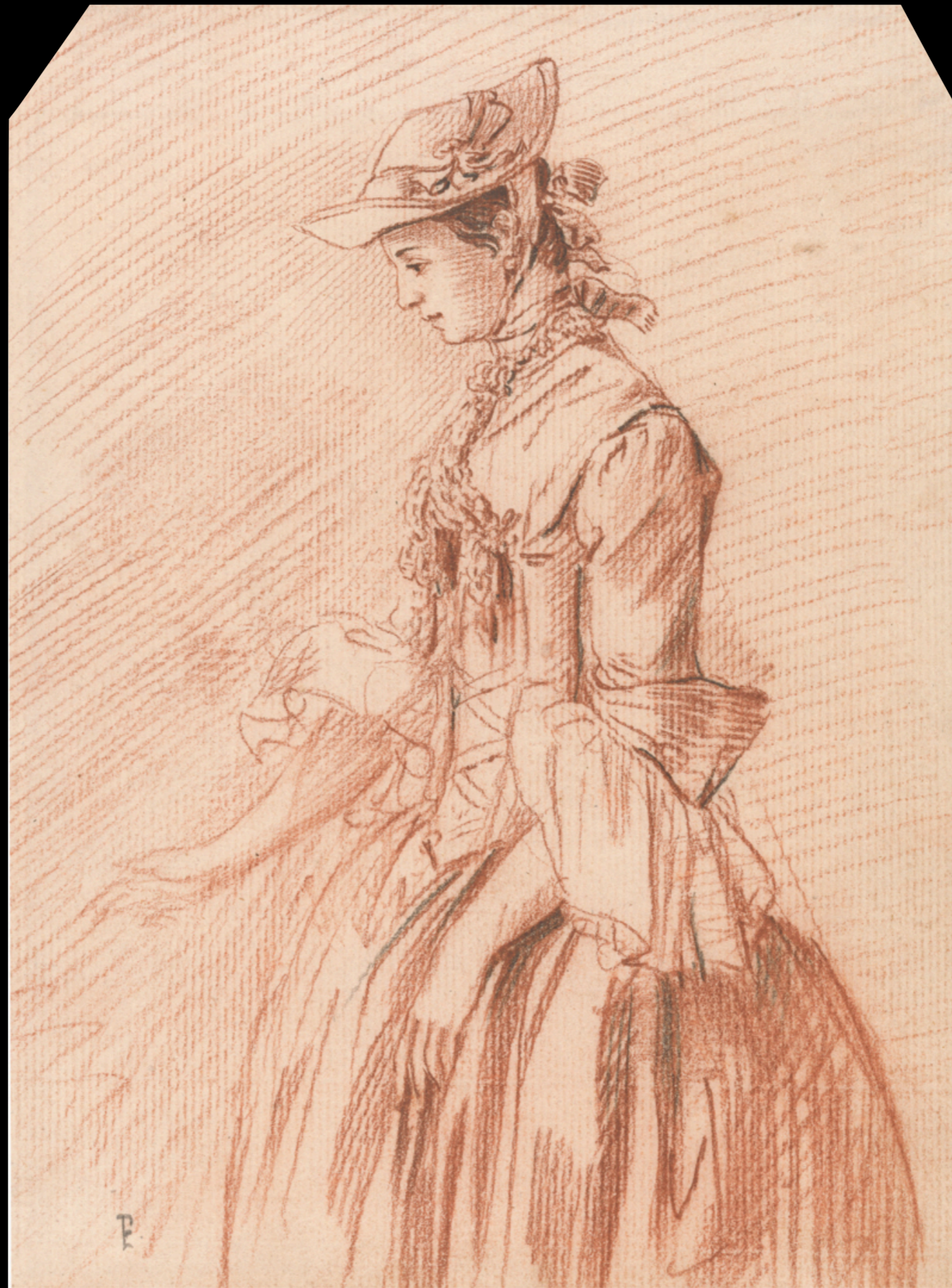
Lady in a Bonnet Paul Sandby c. 1760 - 1765