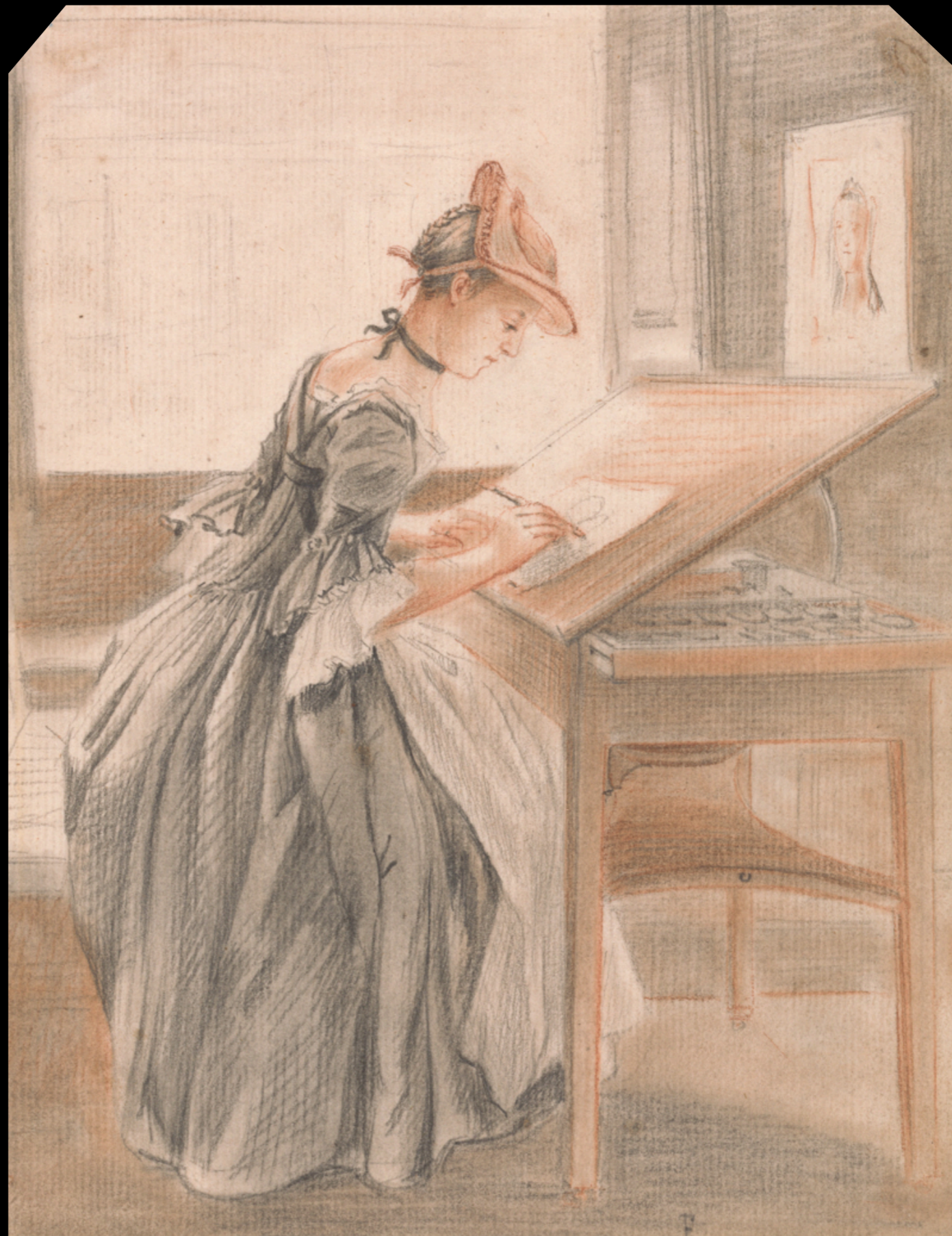
A Lady Copying at a Drawing Table Paul Sandby c. 1765 (Yale Center for British Art)