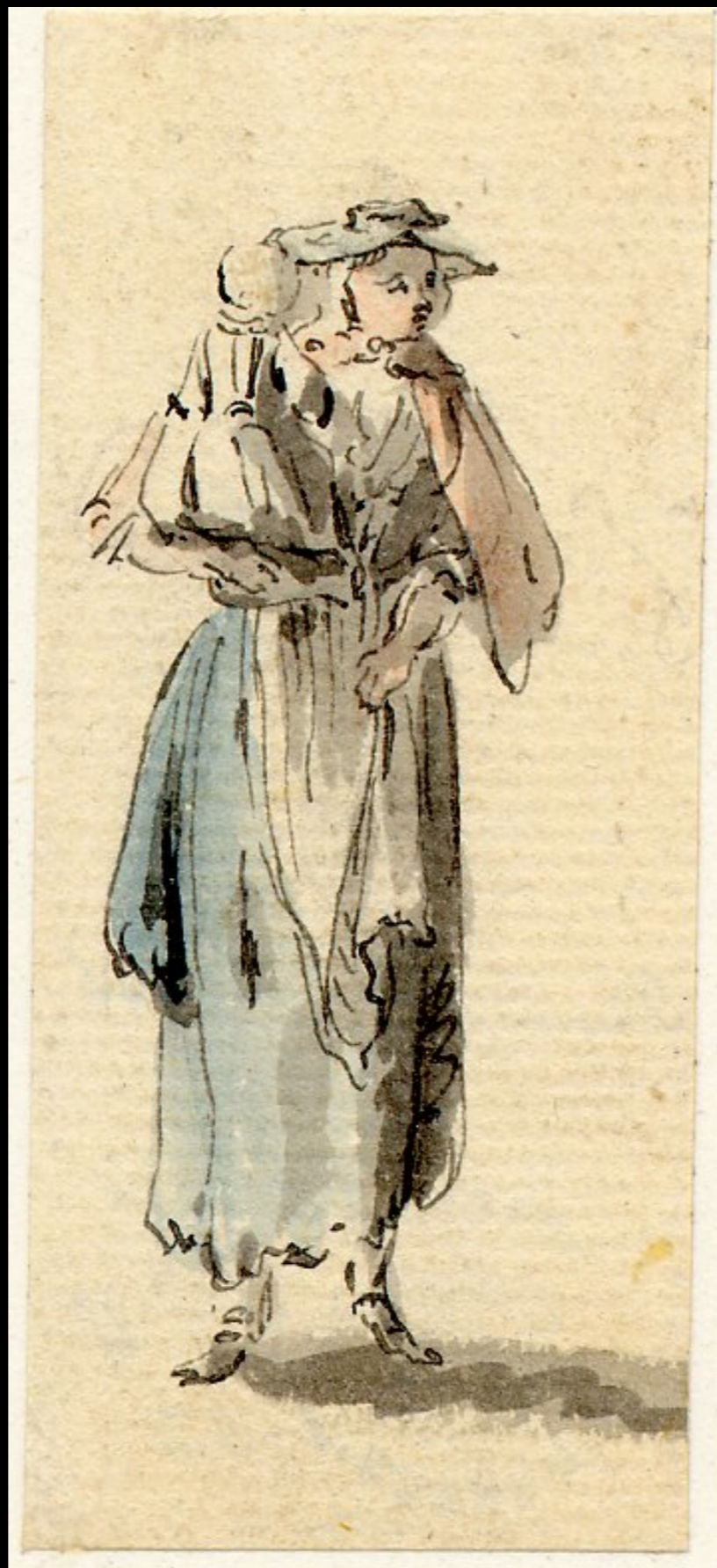
An Edinburgh Woman with Child by Paul Sandby c. 1745 (The British Museum)