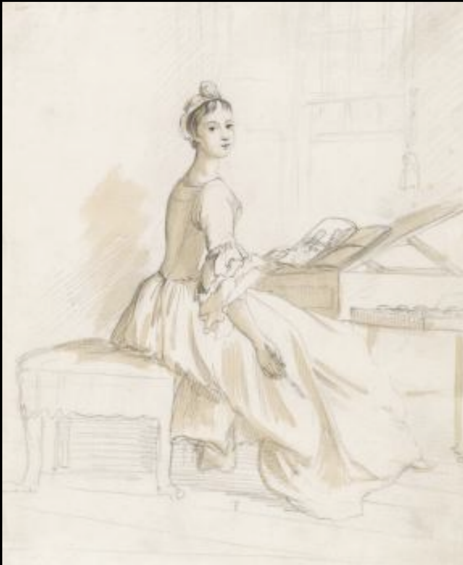
Portrait of a Young Lady at a Drawing Table Paul Sandby