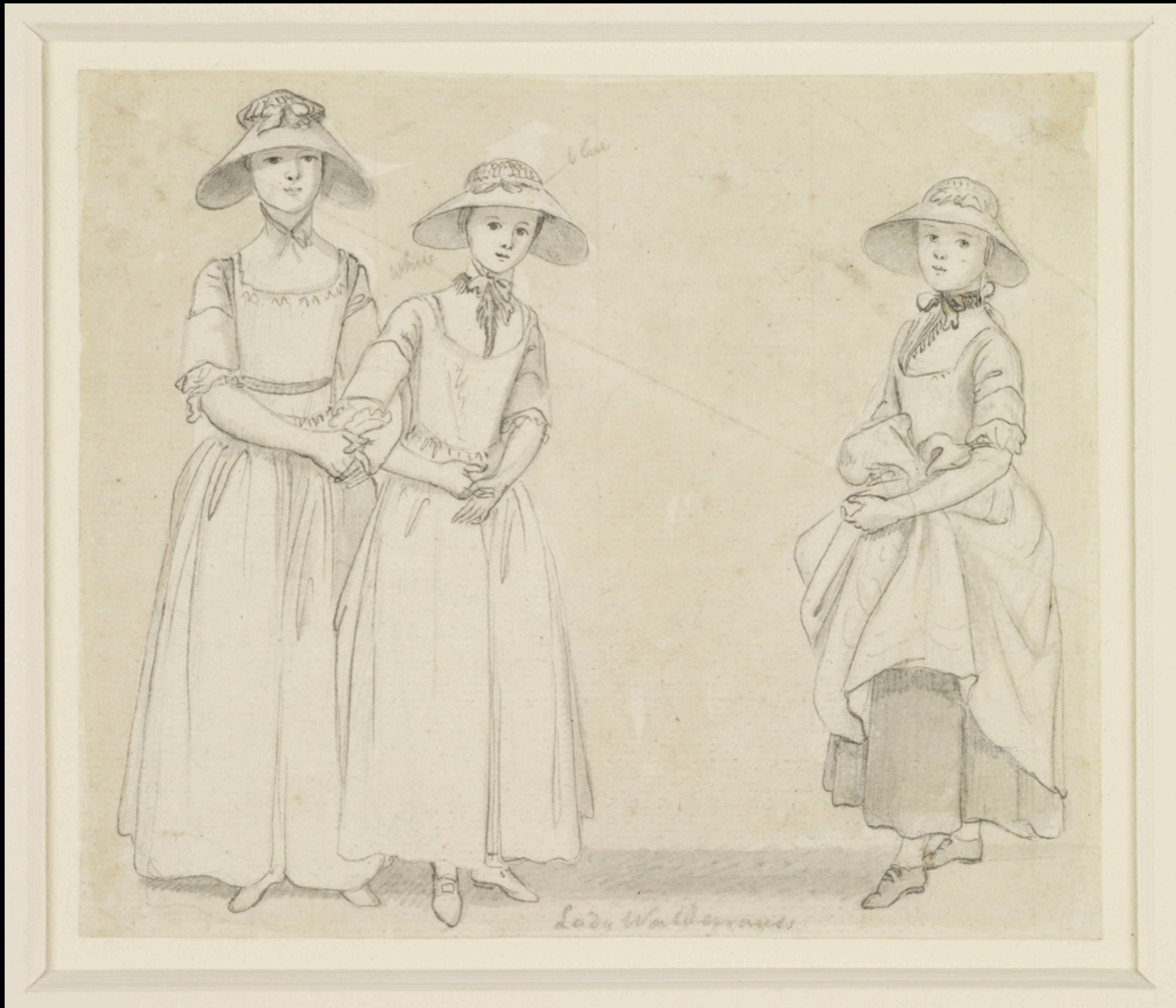
The Ladies Waldegrave by Paul Sandby c. 1760 - 1770