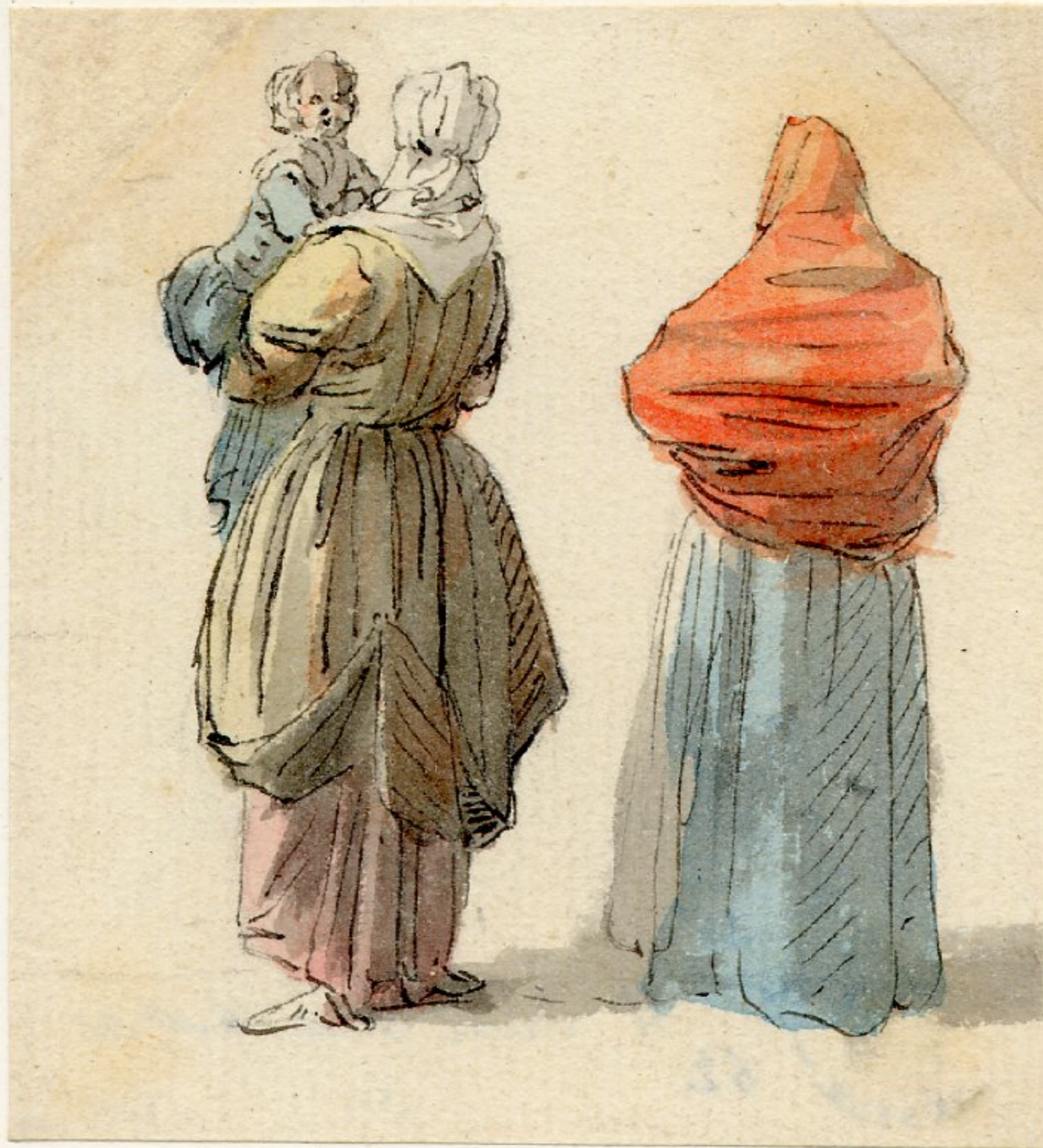
Two Edinburgh Women with Child by Paul Sandby c. 1745 (The British Museum)