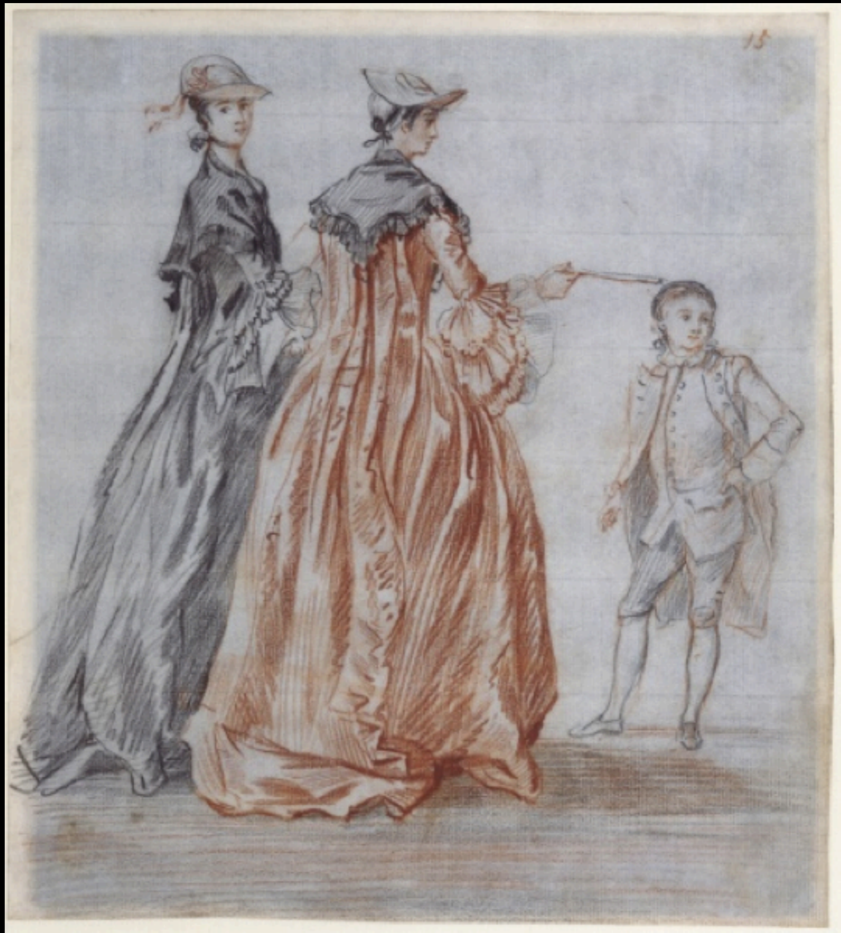
Two Women and a Boy Paul Sandby