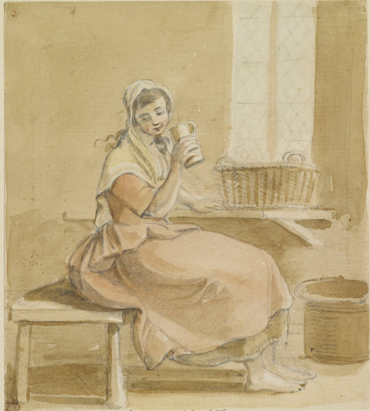
A cottage girl, at Wynnstay