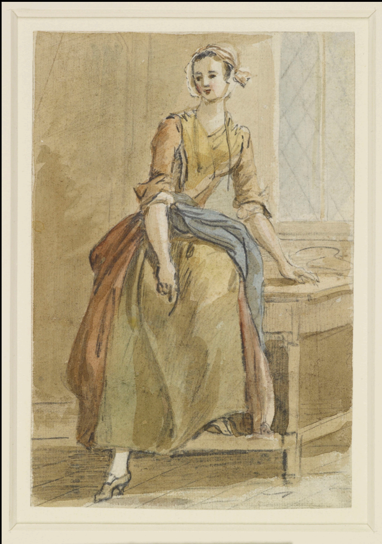
Susan Carrol by Paul Sandby (The Royal Collection)