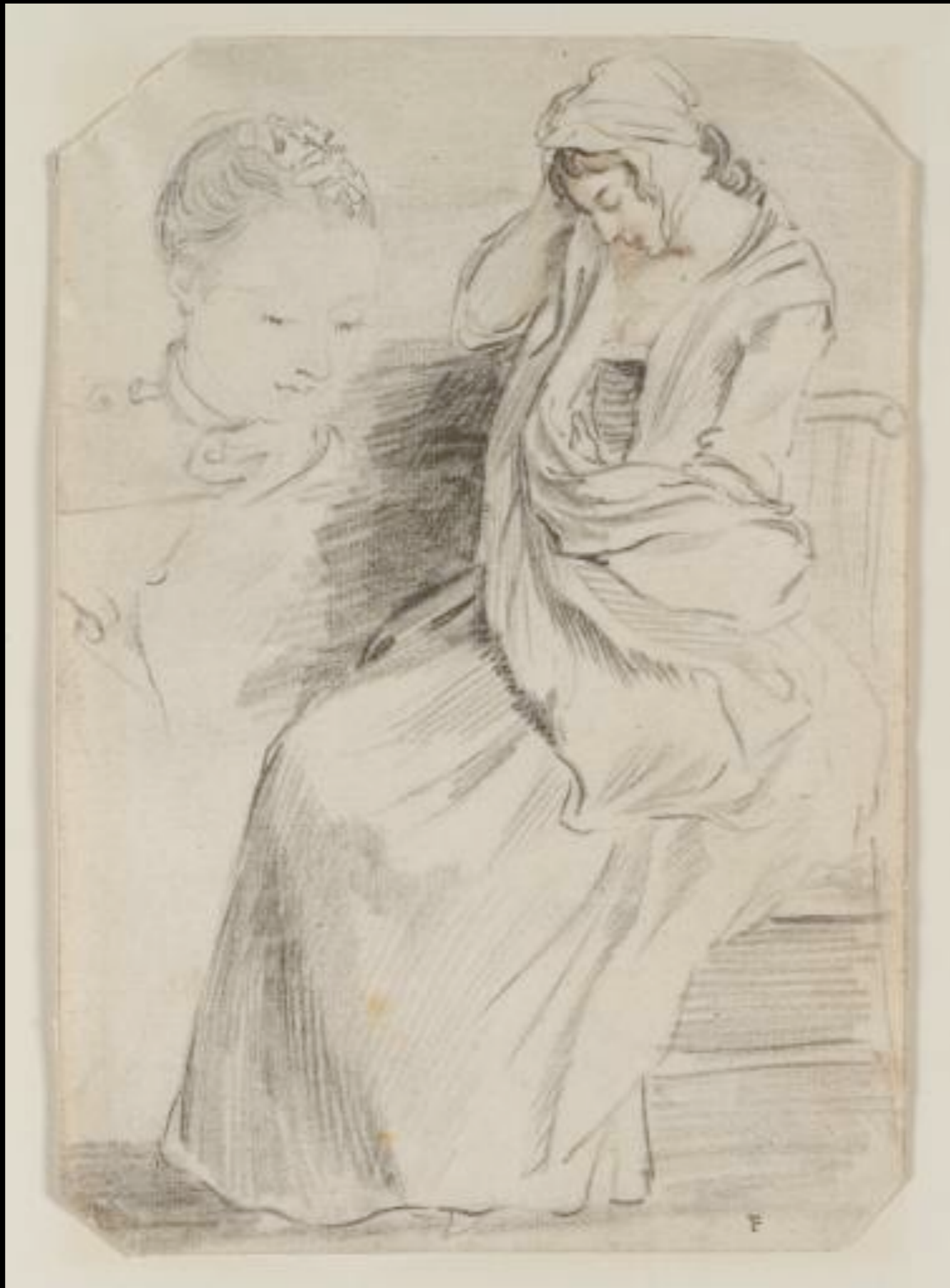
A Sleeping Woman Paul Sandby (Tate Gallery)