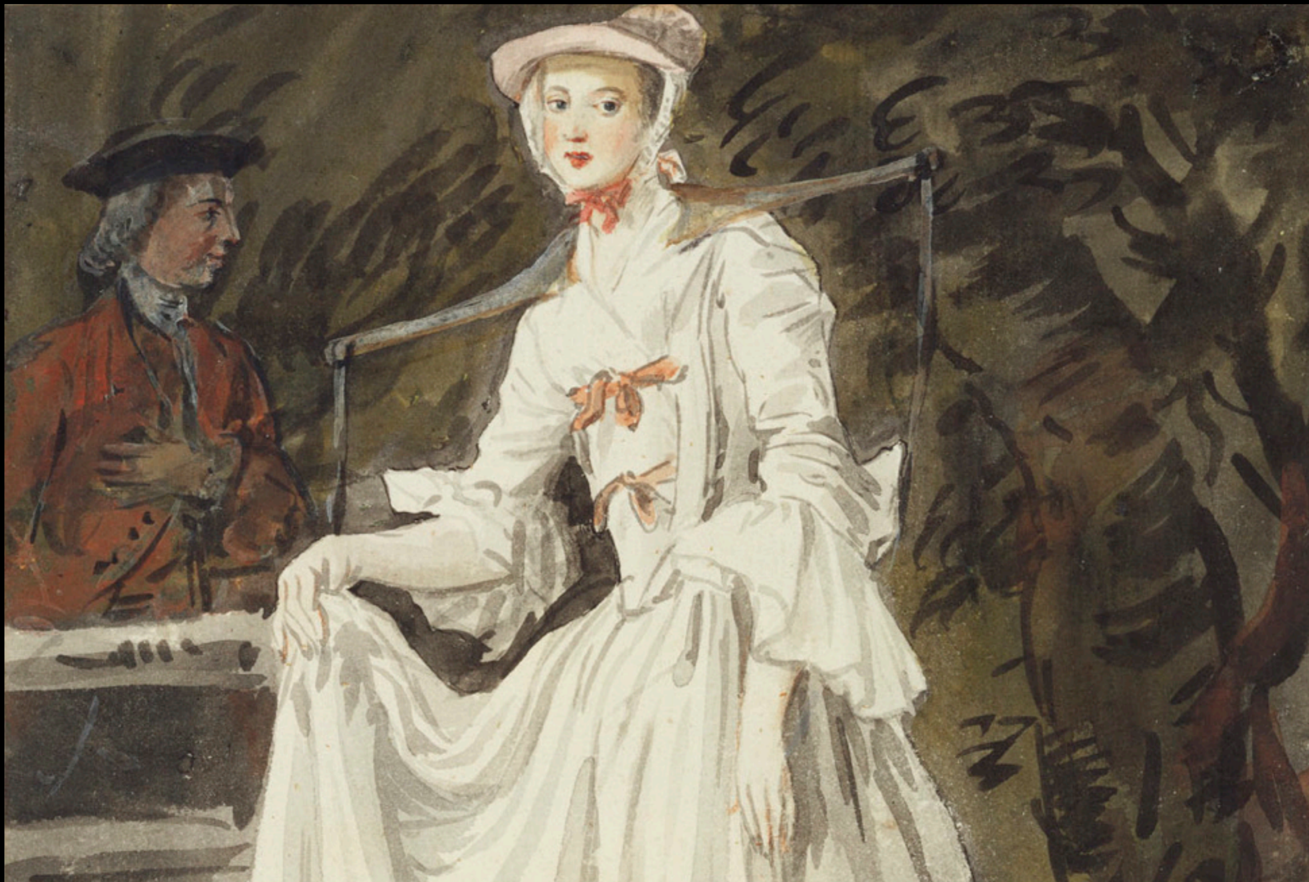
“The celebrated Kitty Fisher” Paul Sandby c. 1758 - 1760 (The Royal Collection)