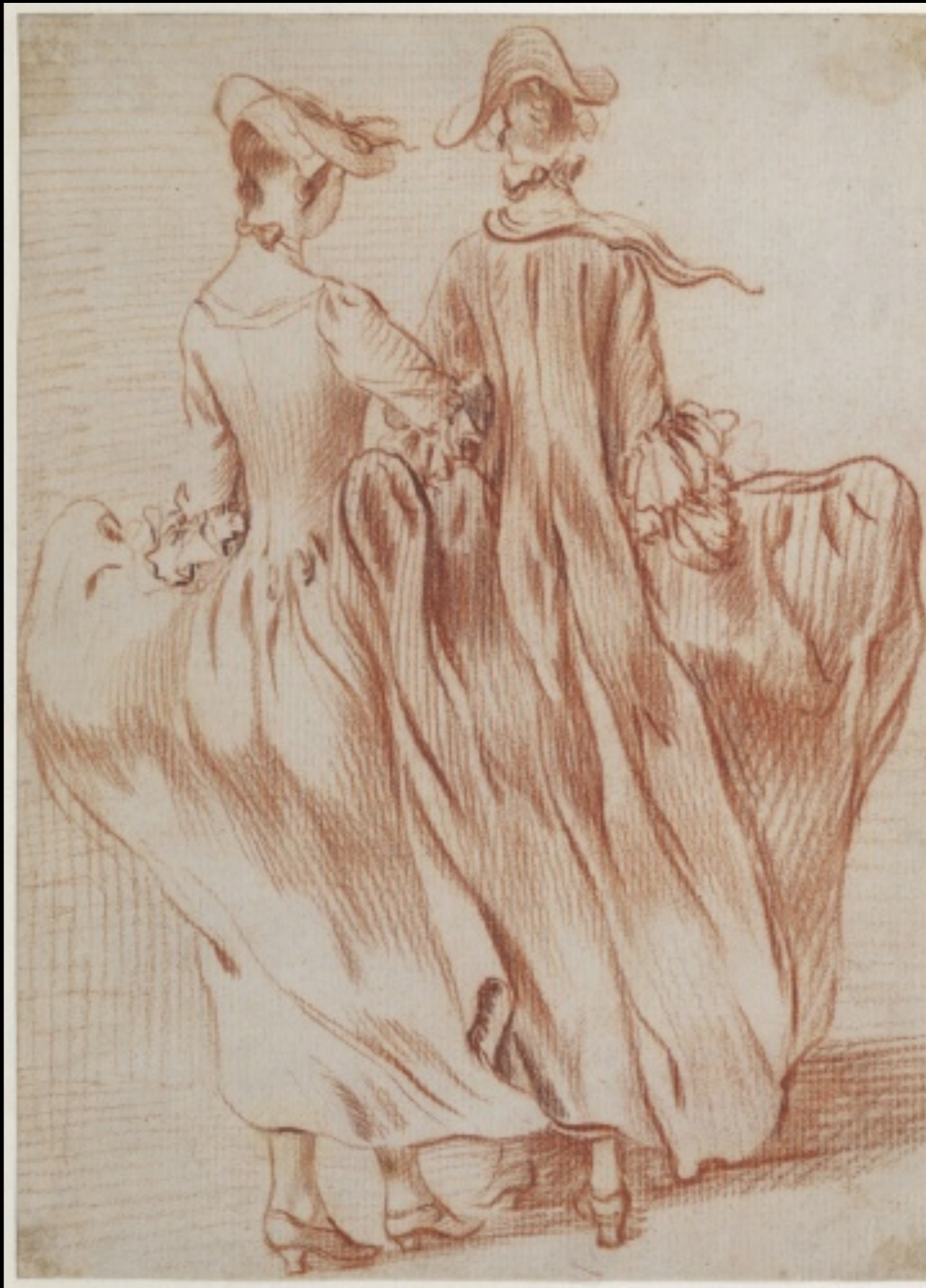
Two Women Paul Sandby (The Royal Collection)