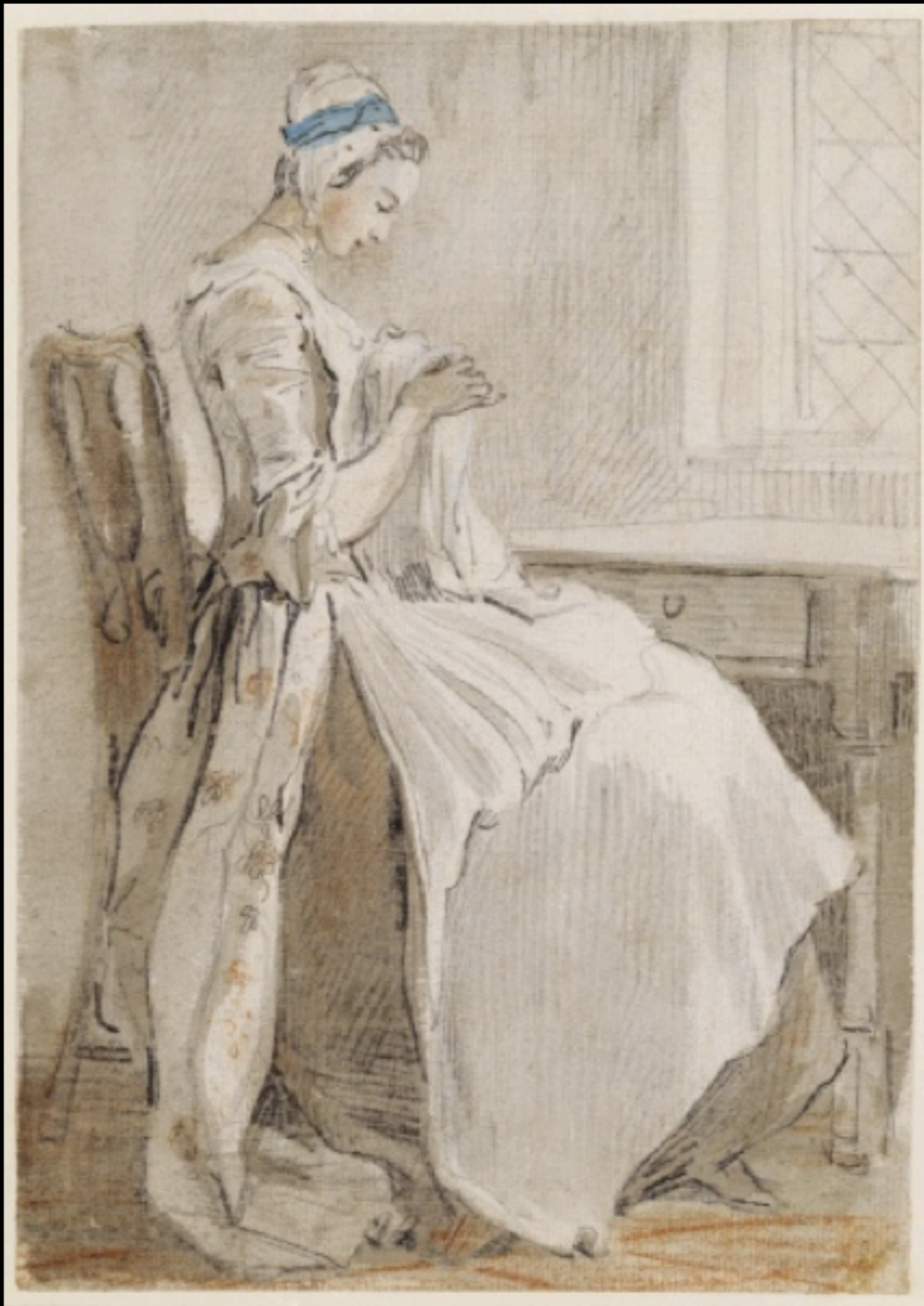
Woman in a Printed Gown Sewing Paul Sandby (Tate Gallery)