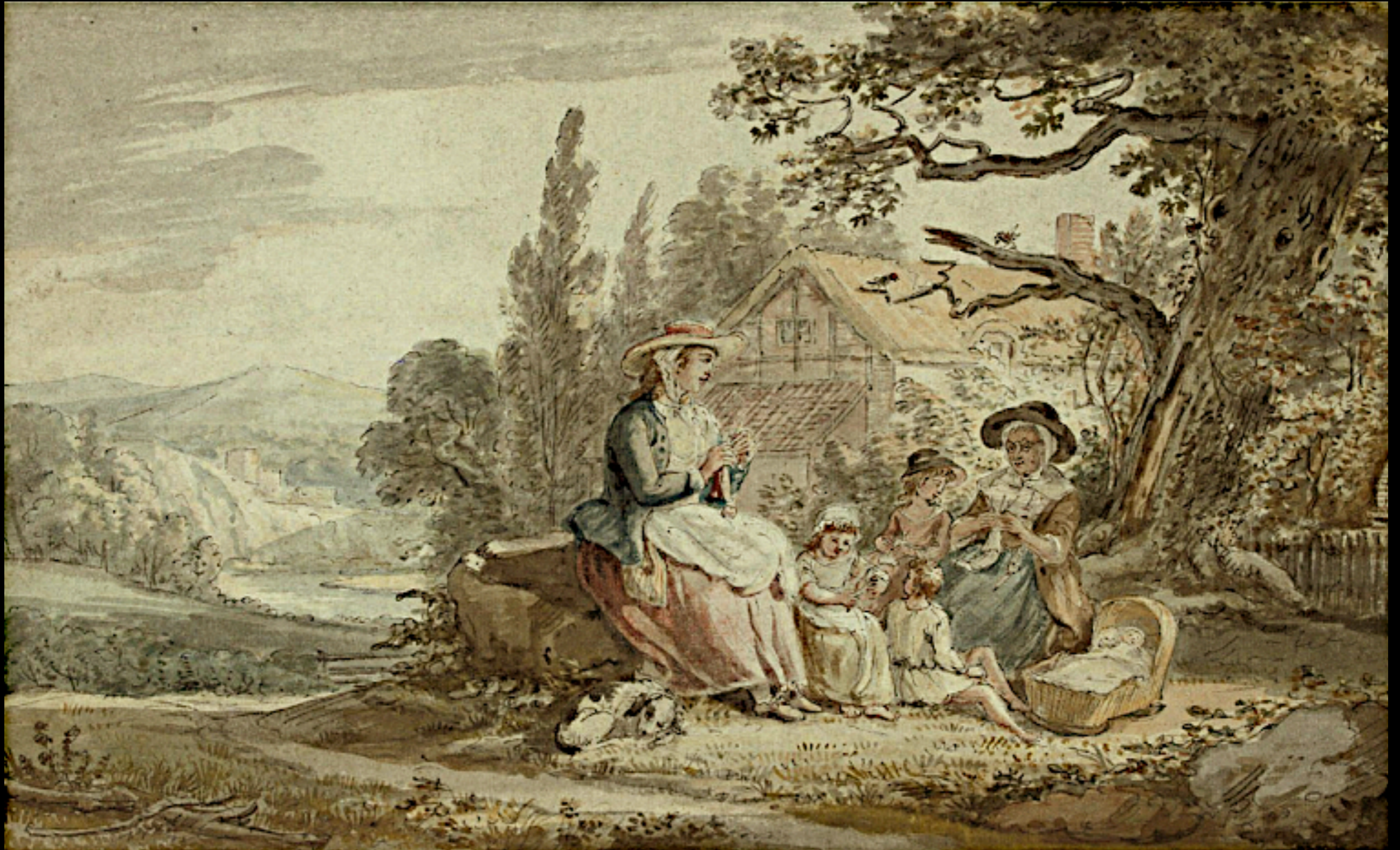
A Family Group Knitting Outside a Cottage by Paul Sandby (Christie's Auction House)