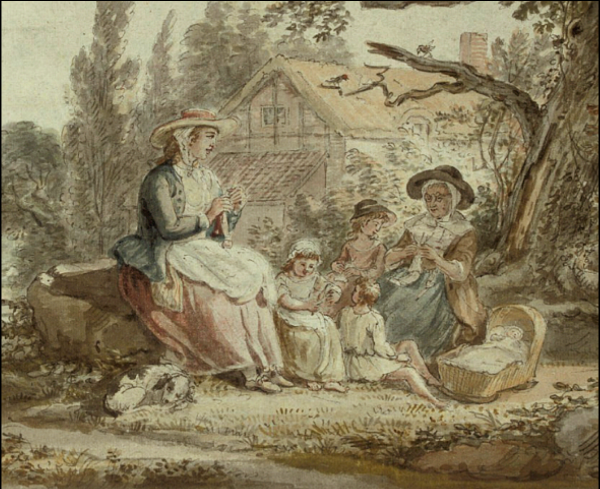
A Family Group Knitting Outside a Cottage by Paul Sandby