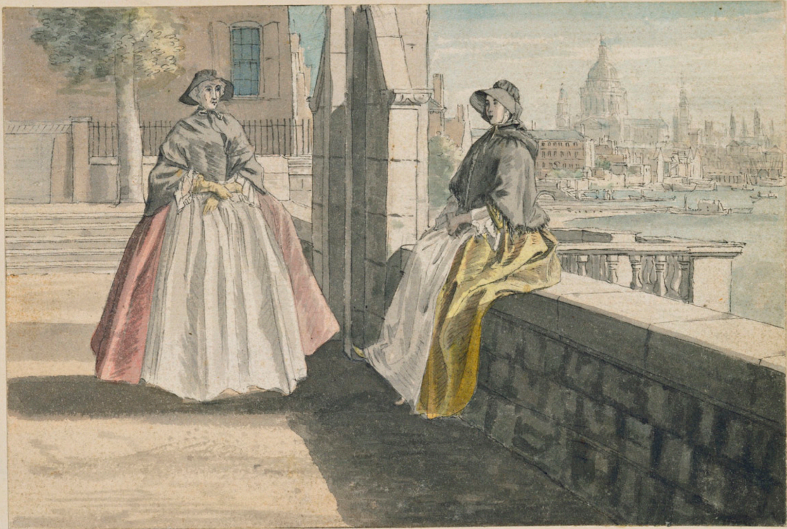
Somerset House Gardens by Paul Sandby c. 1760 (The Royal Collection)