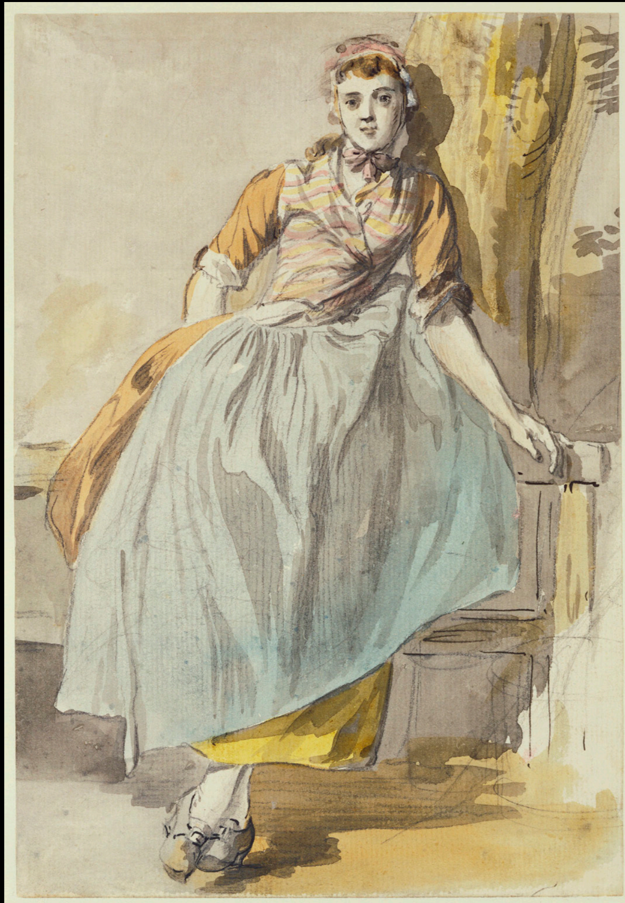
A Country Girl by Paul Sandby c. 1770 (The Royal Collection)