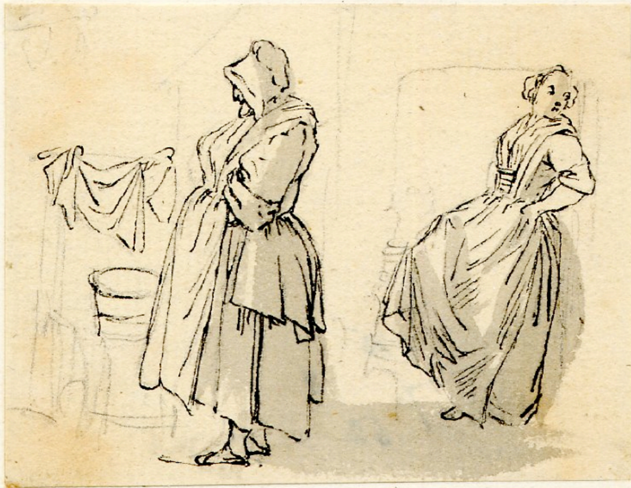
Two Edinburgh Washerwomen by Paul Sandby c. 1745 (The British Museum)