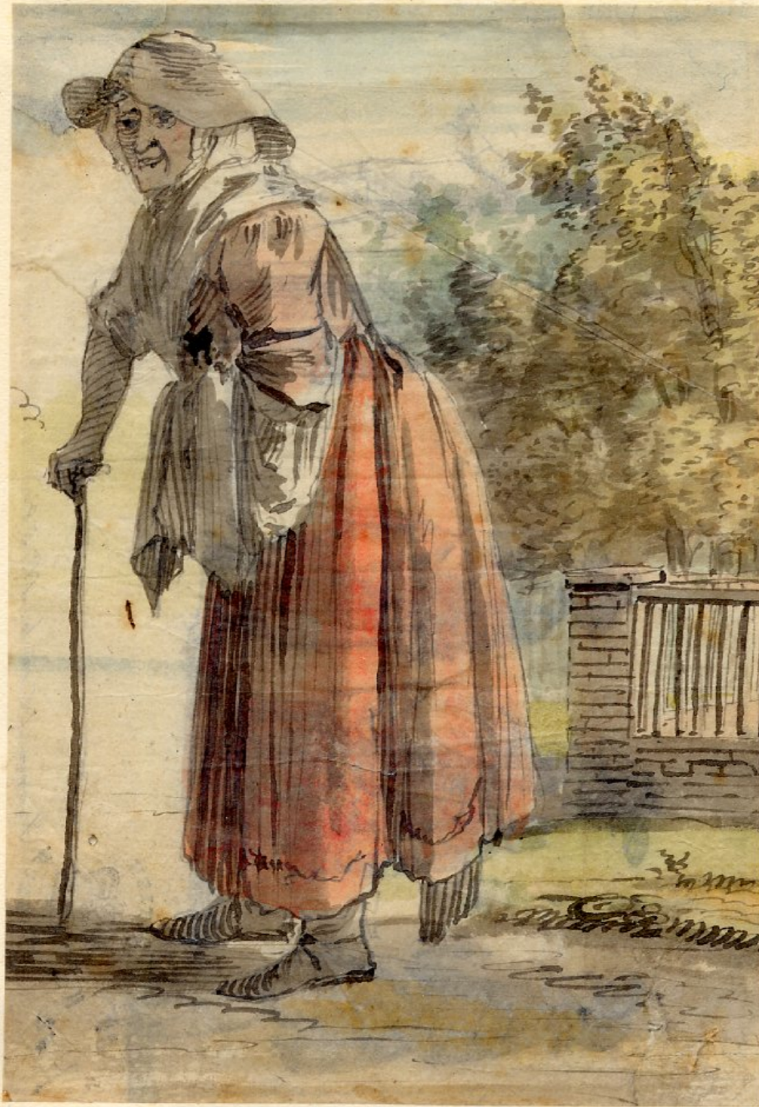
An Old Edinburgh Woman by Paul Sandby c. 1745 (The British Museum)