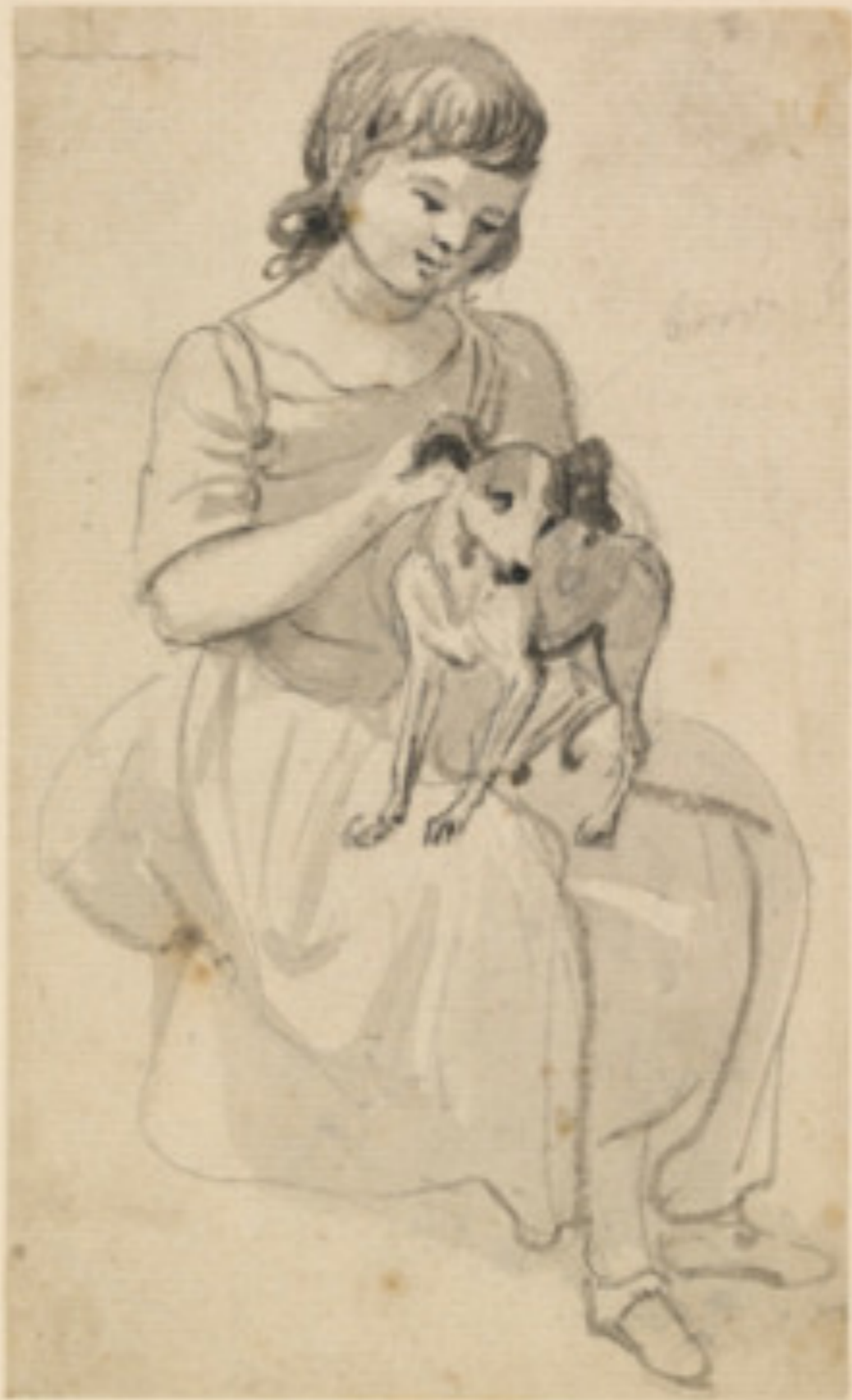
Girl With a Dog Paul Sandby (Tate Gallery)