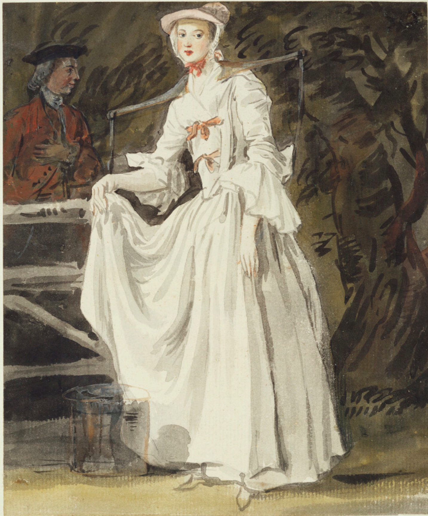
“The celebrated Kitty Fisher” Paul Sandby c. 1758 - 1760