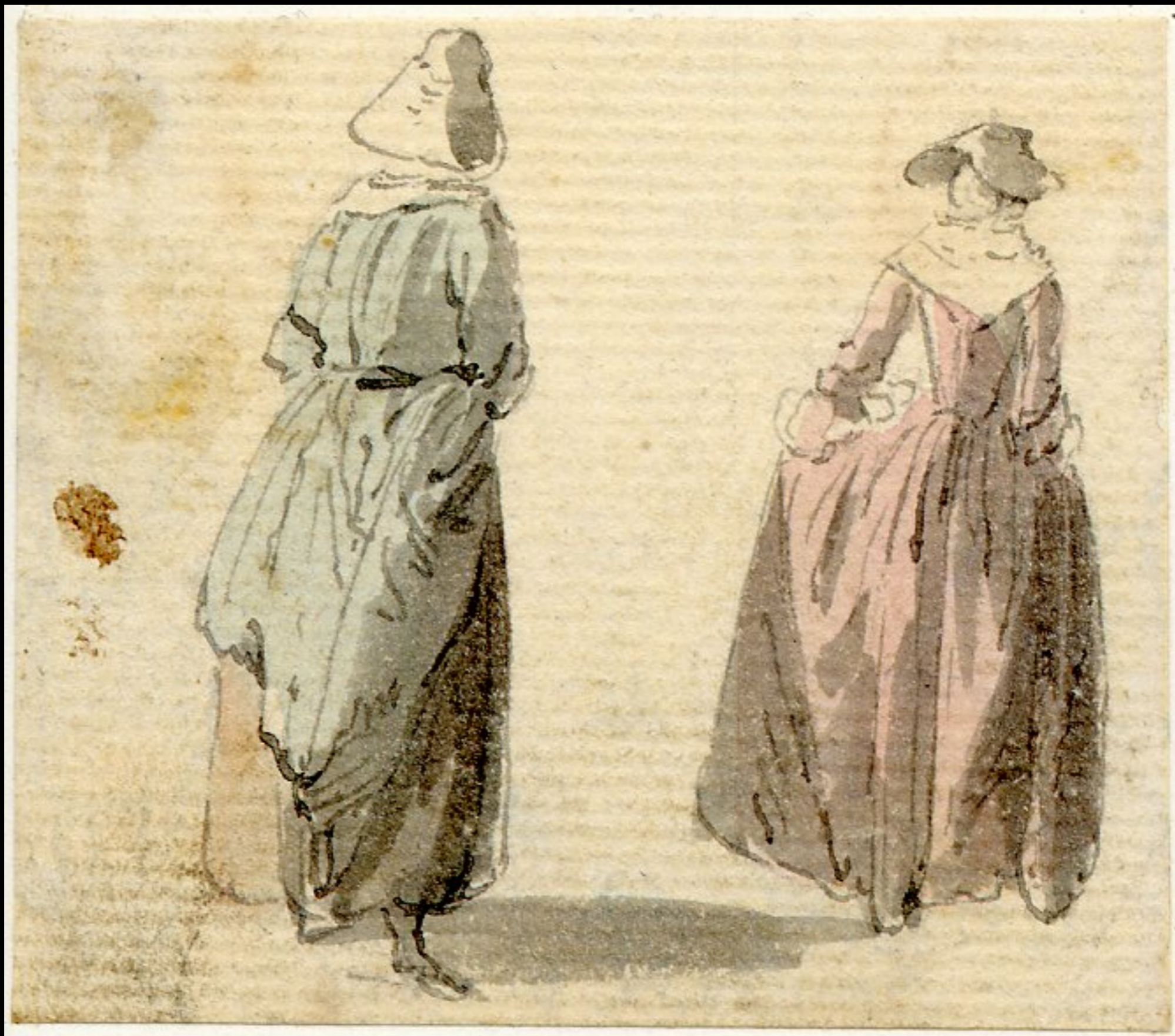
Two Women Seen from Behind by Paul Sandby (The British Museum)