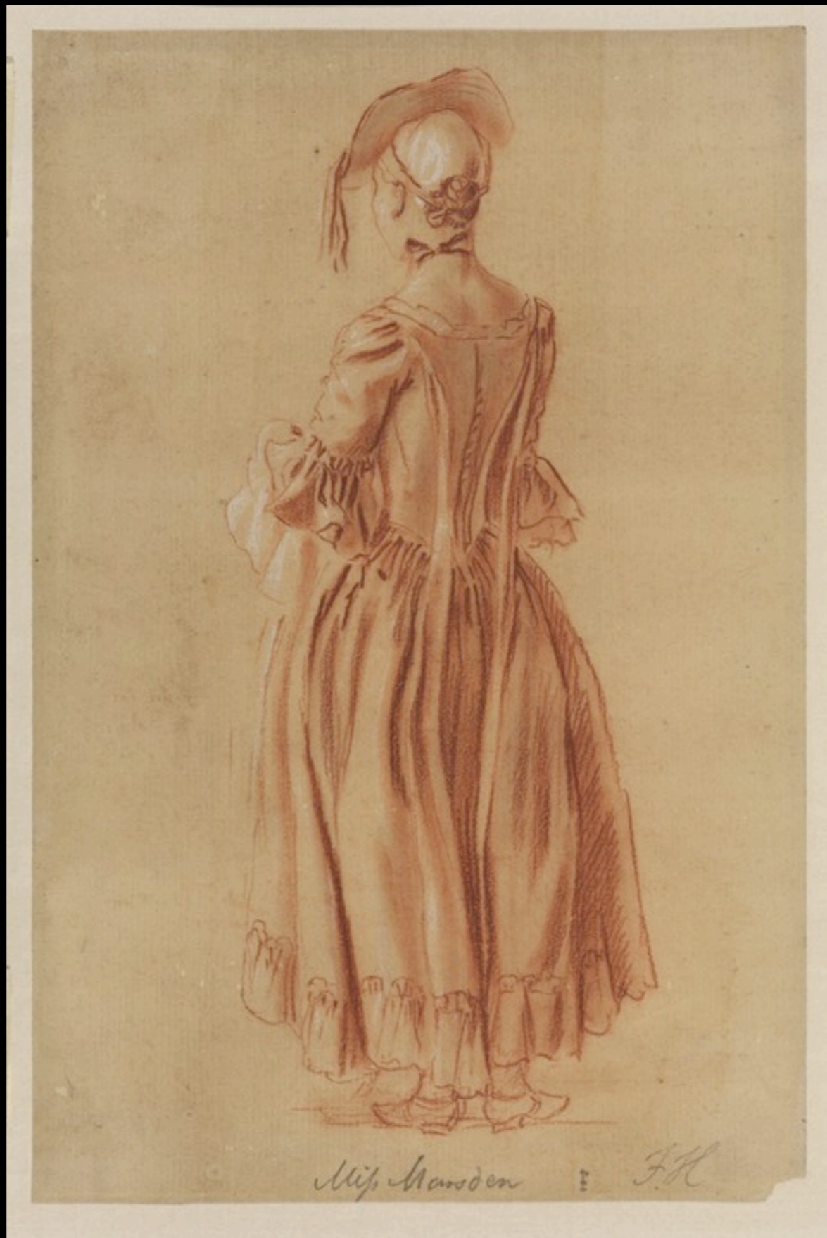
“Miss Marsden” Paul Sandby