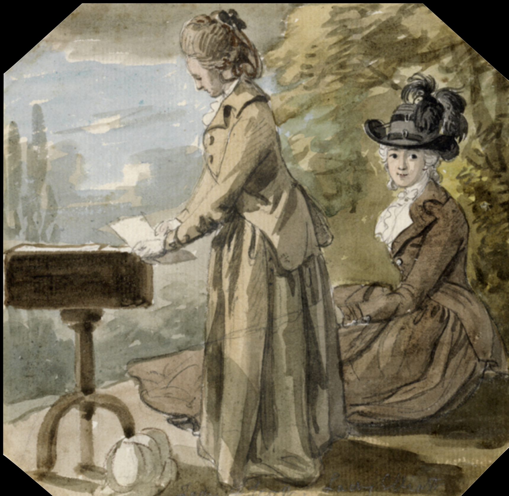
Women in Riding Habits by Paul Sandby (Tate Gallery)