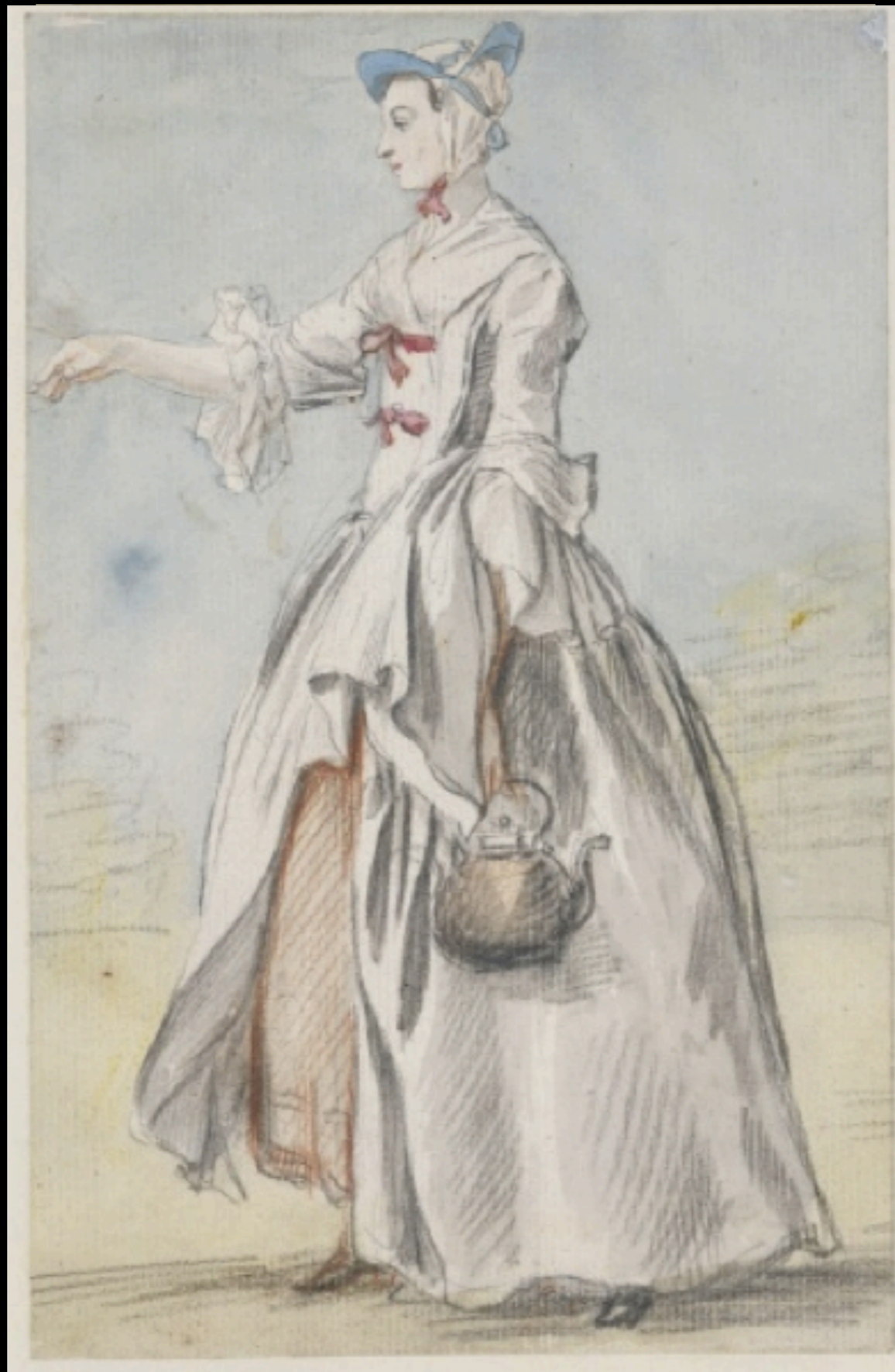
Lady Carrying a Tea Kettle Paul Sandby (The Royal Collection)