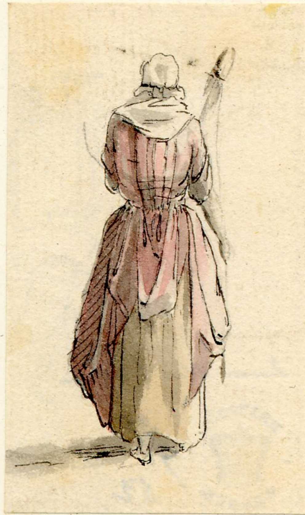
An Edinburgh Woman with a Distaff by Paul Sandby c. 1745 (The British Museum)