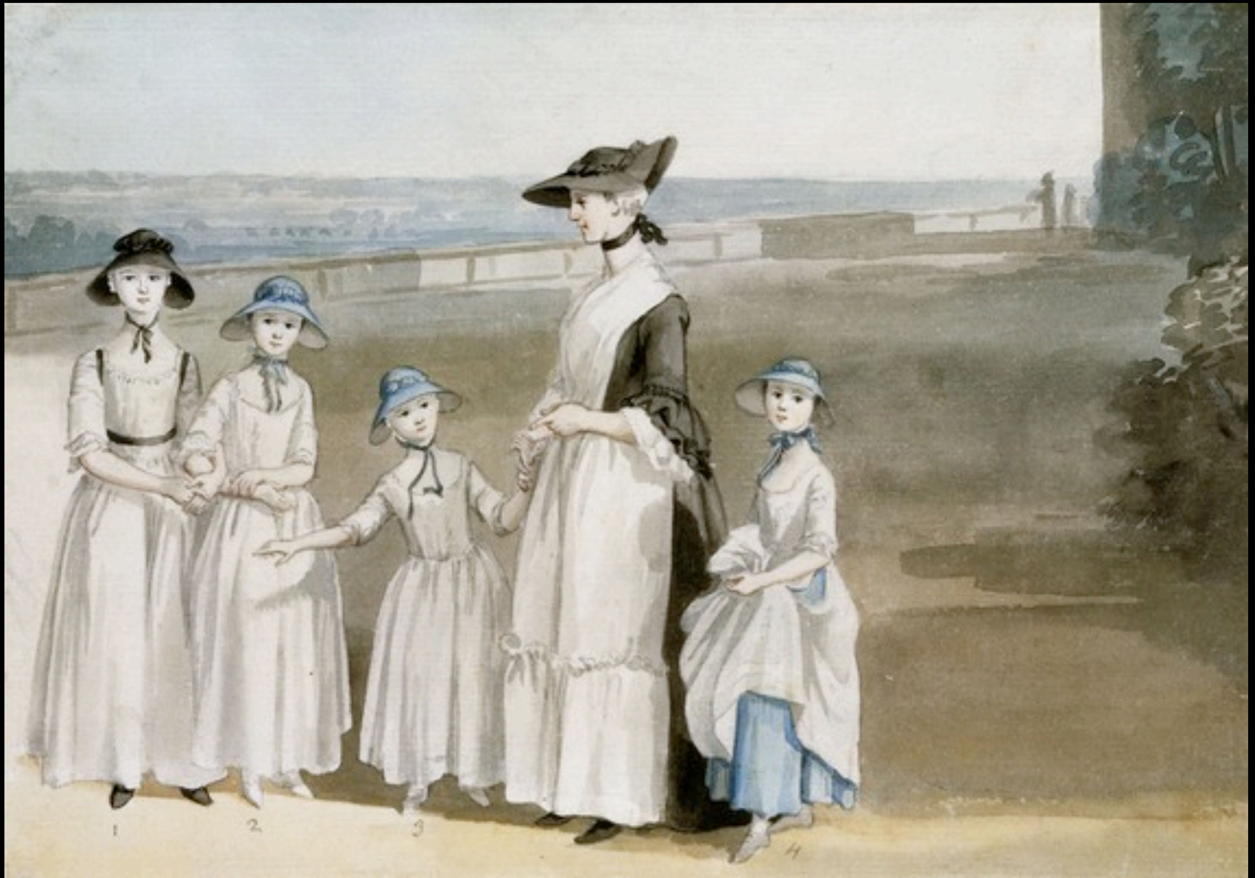
Three Daughters of the 2nd Earl of Waldegrave and Miss Keppel Paul Sandby