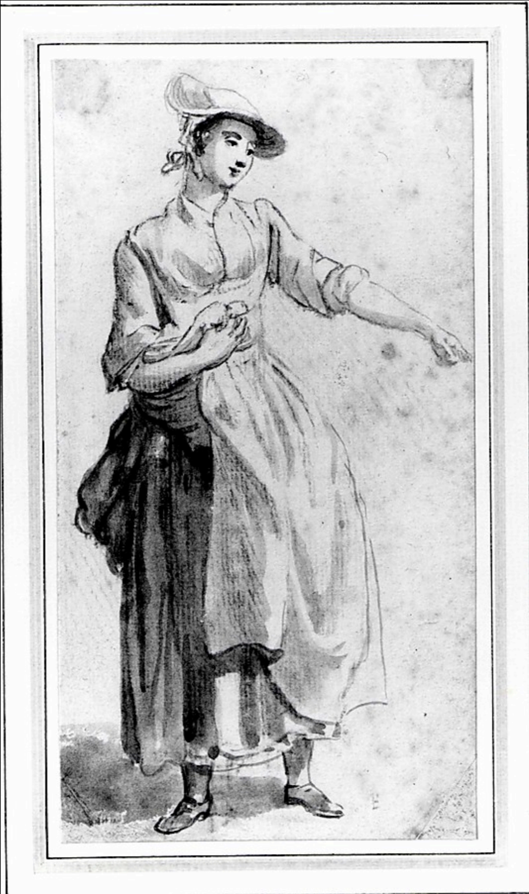
A Young Woman, Full Length, with Her Left Arm Outstretched by Paul Sandby c. 1770 (Metropolitan Museum of Art)