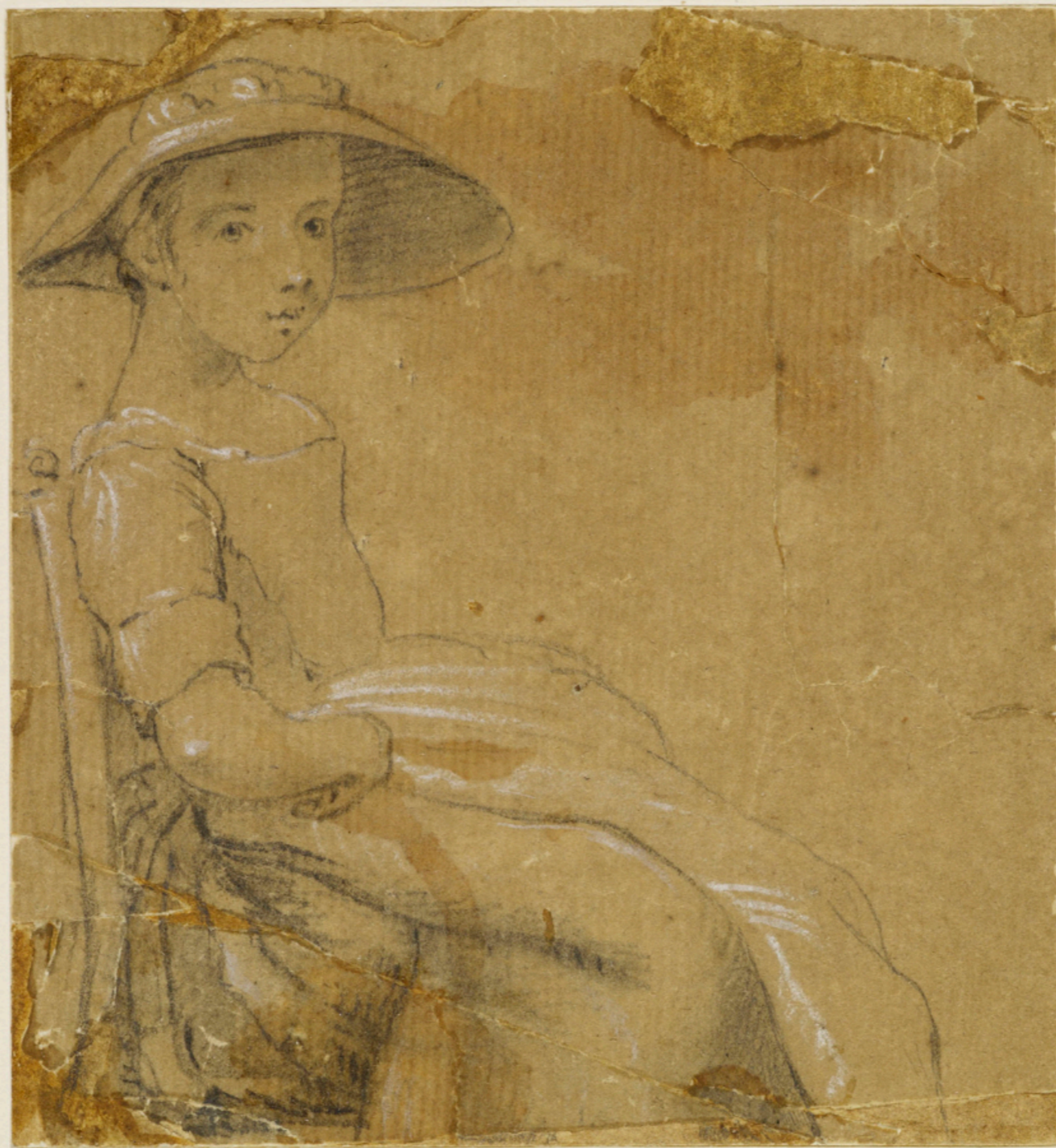
Seated Girl by Paul Sandby (The Royal Collection)