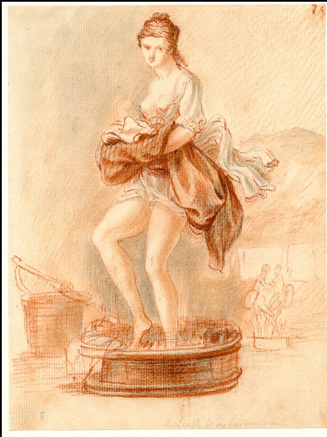
An Edinburgh Washerwomen by Paul Sandby c. 1745 (The British Museum)