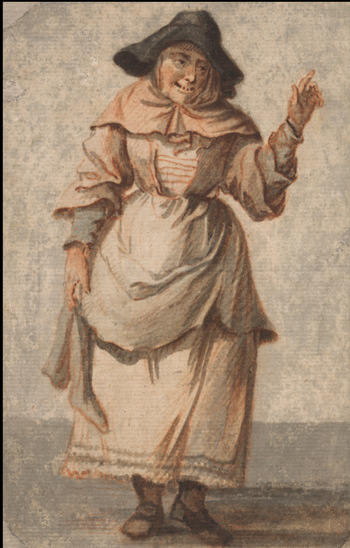
An old Market Woman Paul Sandby