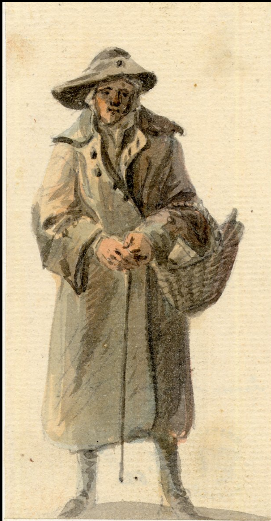
An Edinburgh Old Woman Carrying a Basket Paul Sandby c. 1745 (The British Museum)