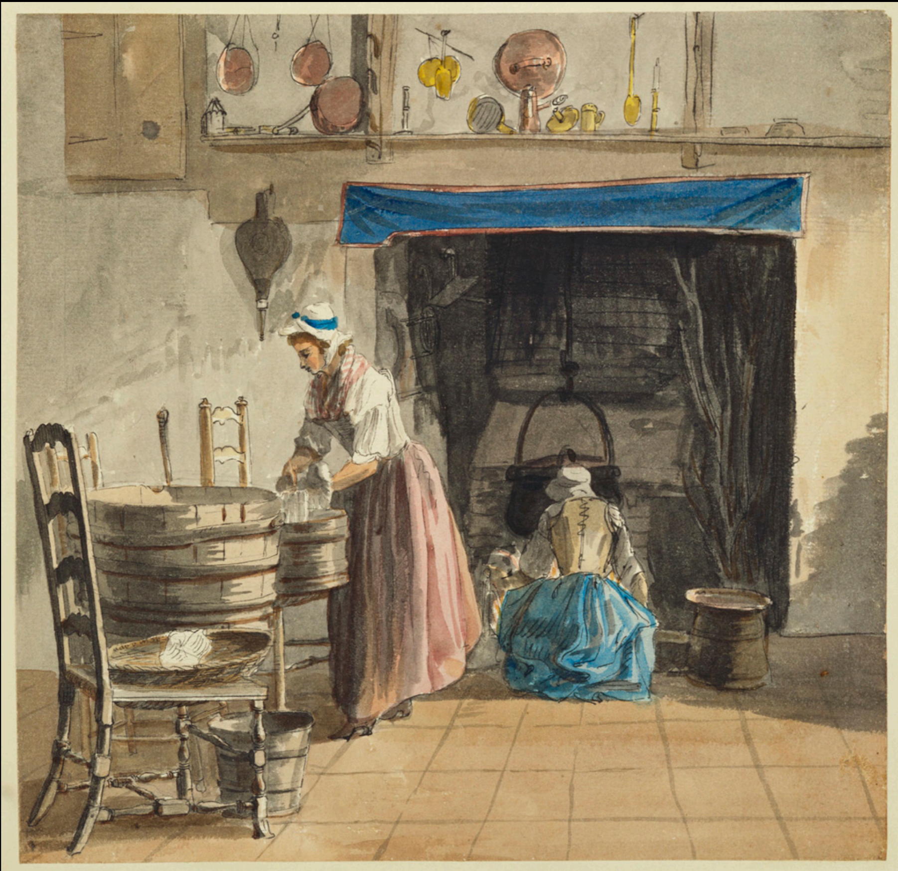
At Sandpit Gate by Paul Sandby