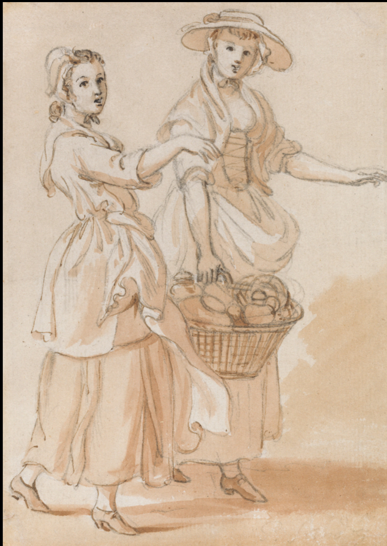
Two Girls Carrying a Basket Paul Sandby