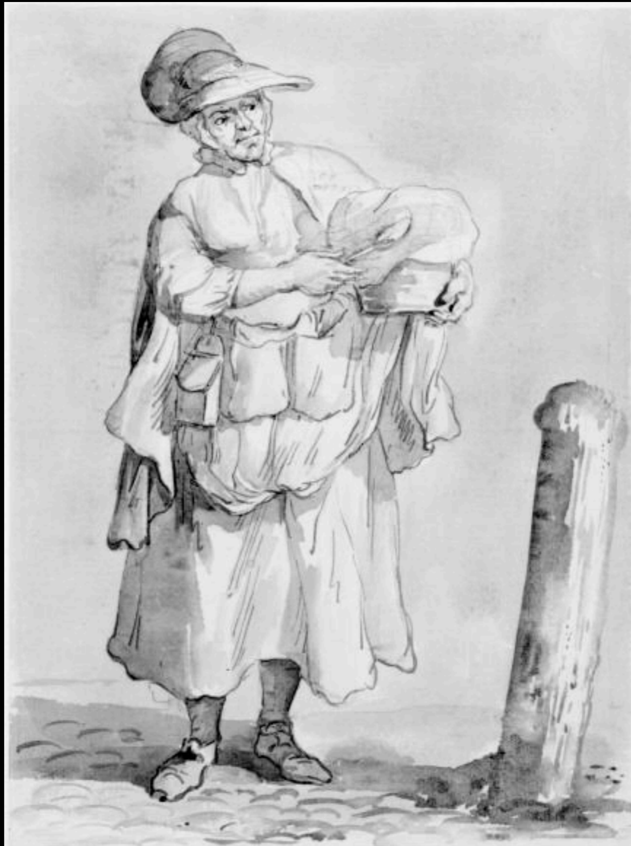
Woman with a Spoon & Covered Basket Paul Sandby (Huntington)