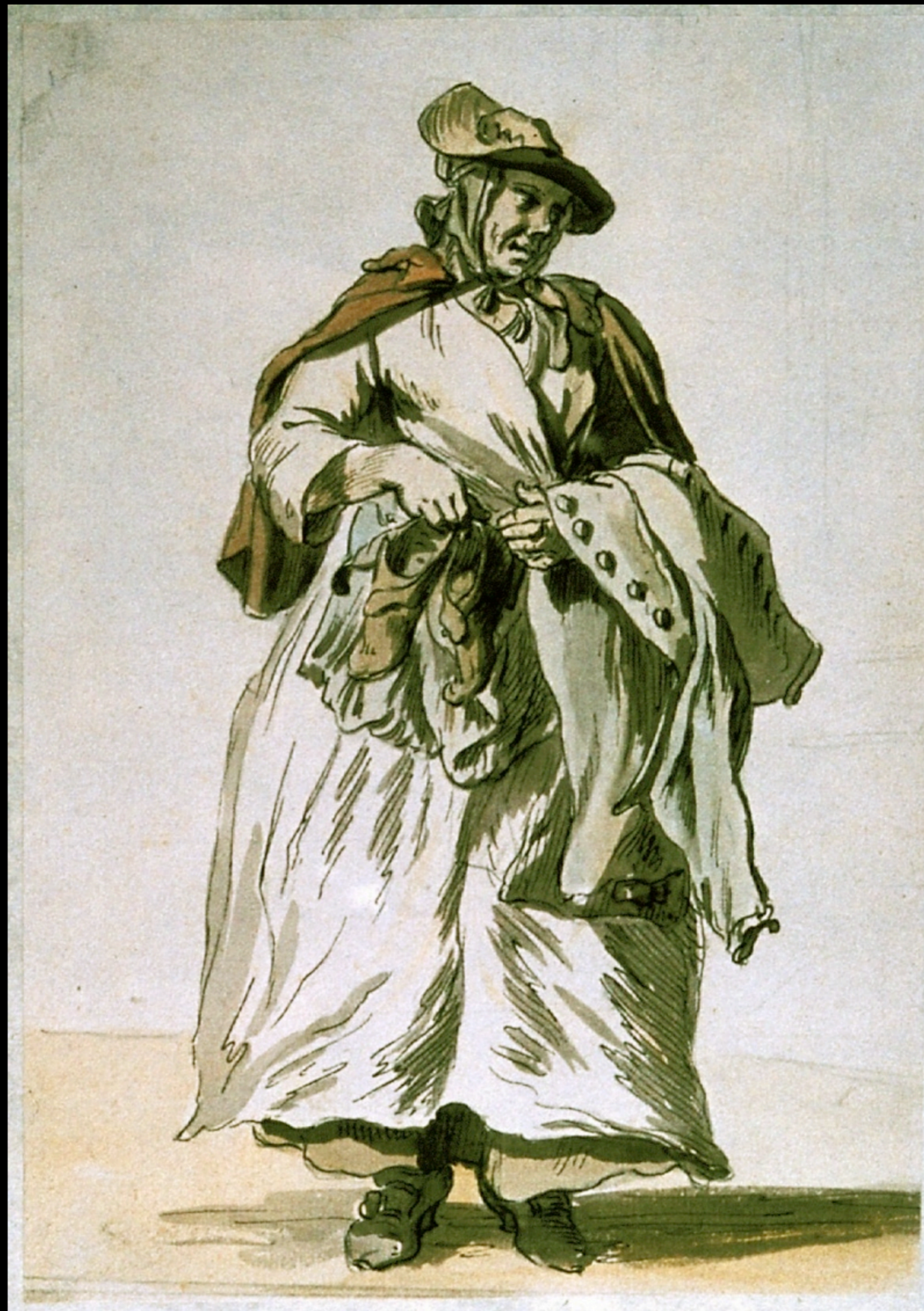
Cries of London - "Old Clothes to Sell" Paul Sandby 1759