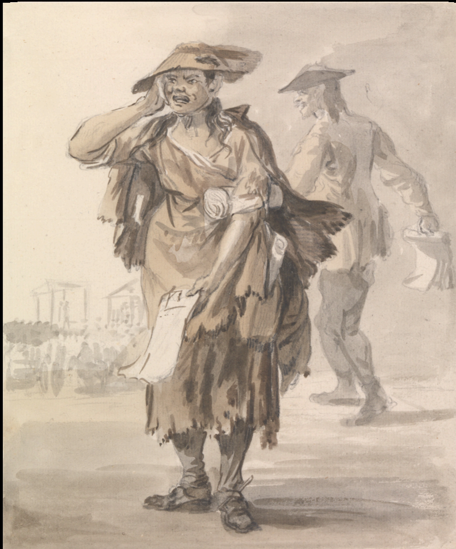
London Cries: Last Dying Speech and Confession Paul Sandby c. 1759 (Yale Center for British Art)