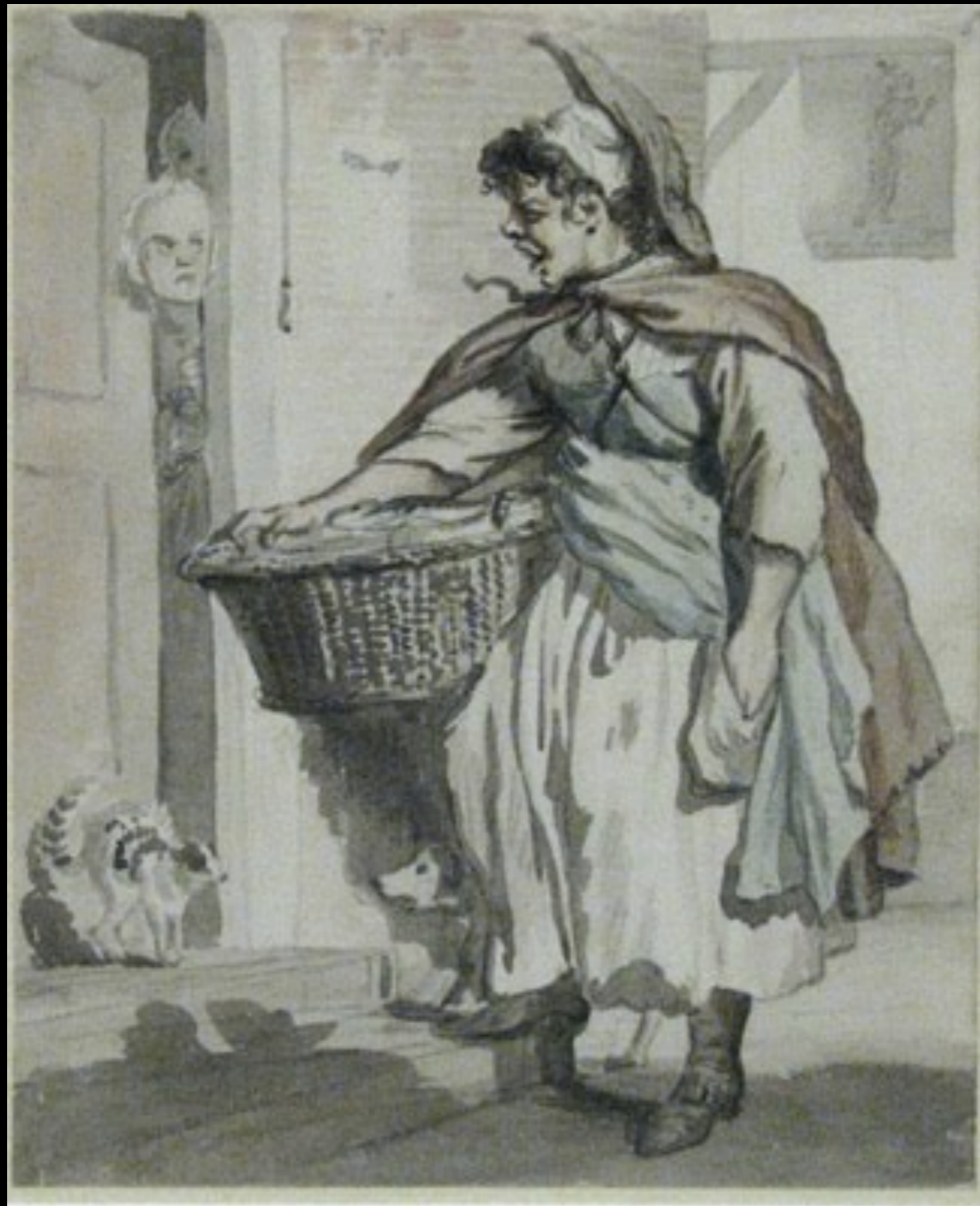
"Rare mackerel, Three a Groat or Four for Sixpence" Paul Sandby