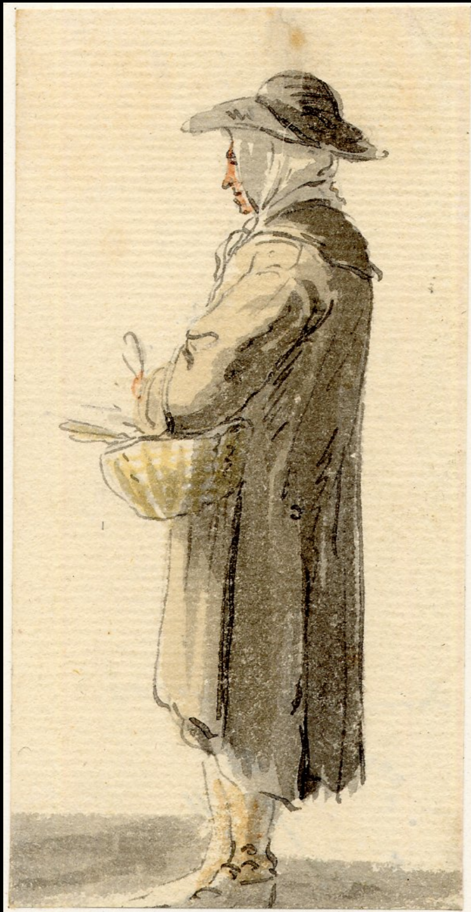
An Edinburgh Old Woman Carrying a Basket Paul Sandby c. 1745