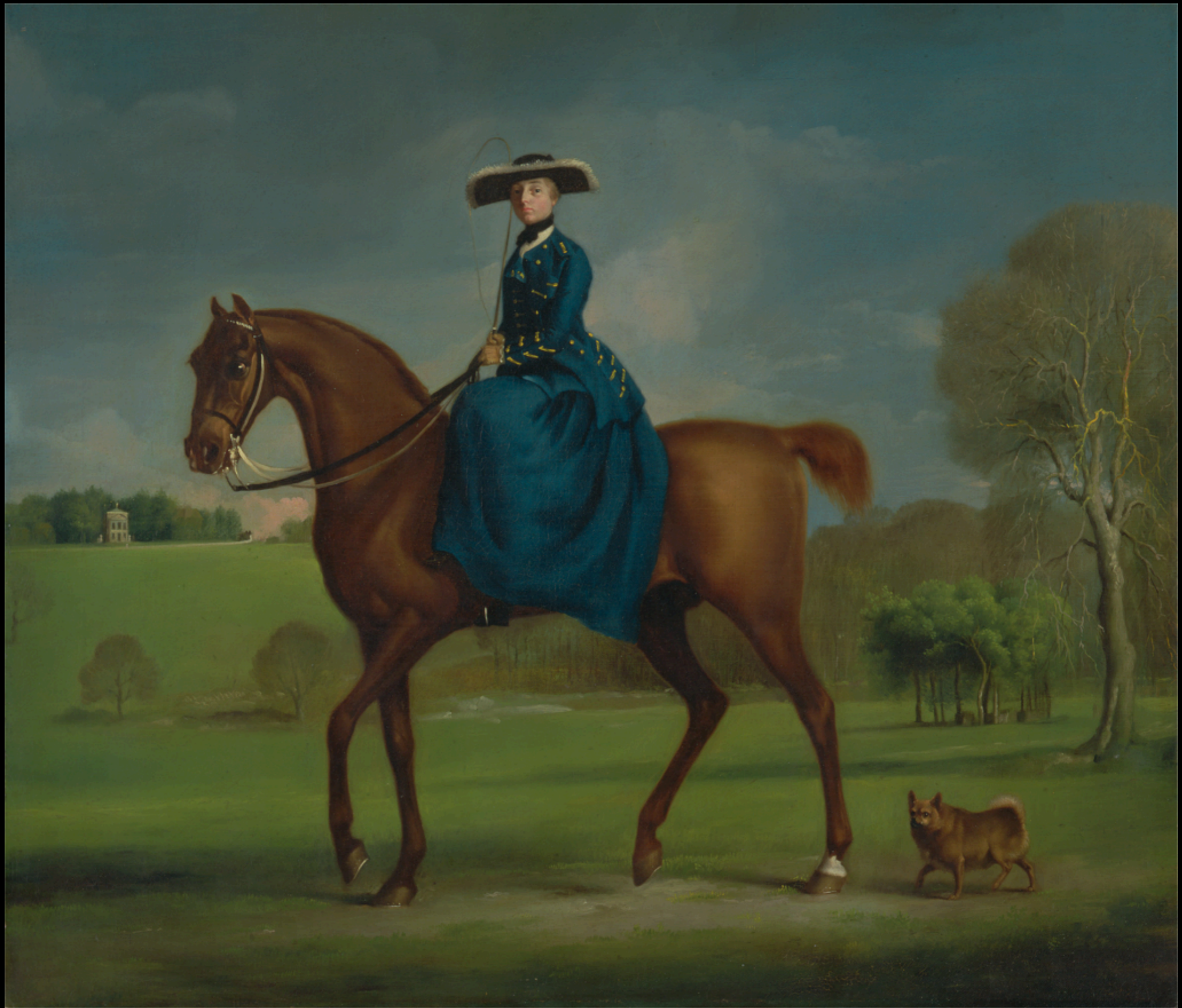
The Countess of Coningsby of the Charlton Hunt by George Stubbs c. 1760 (Yale Center for British Art)