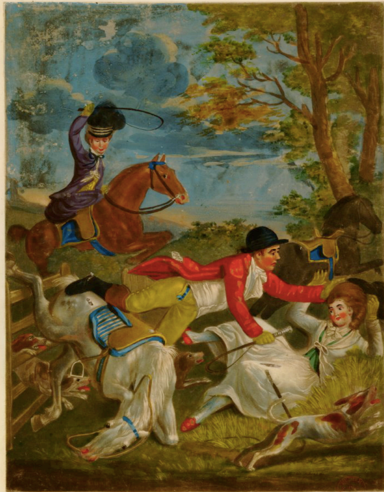
A SOFT TUMBLE after a HARD RIDE.