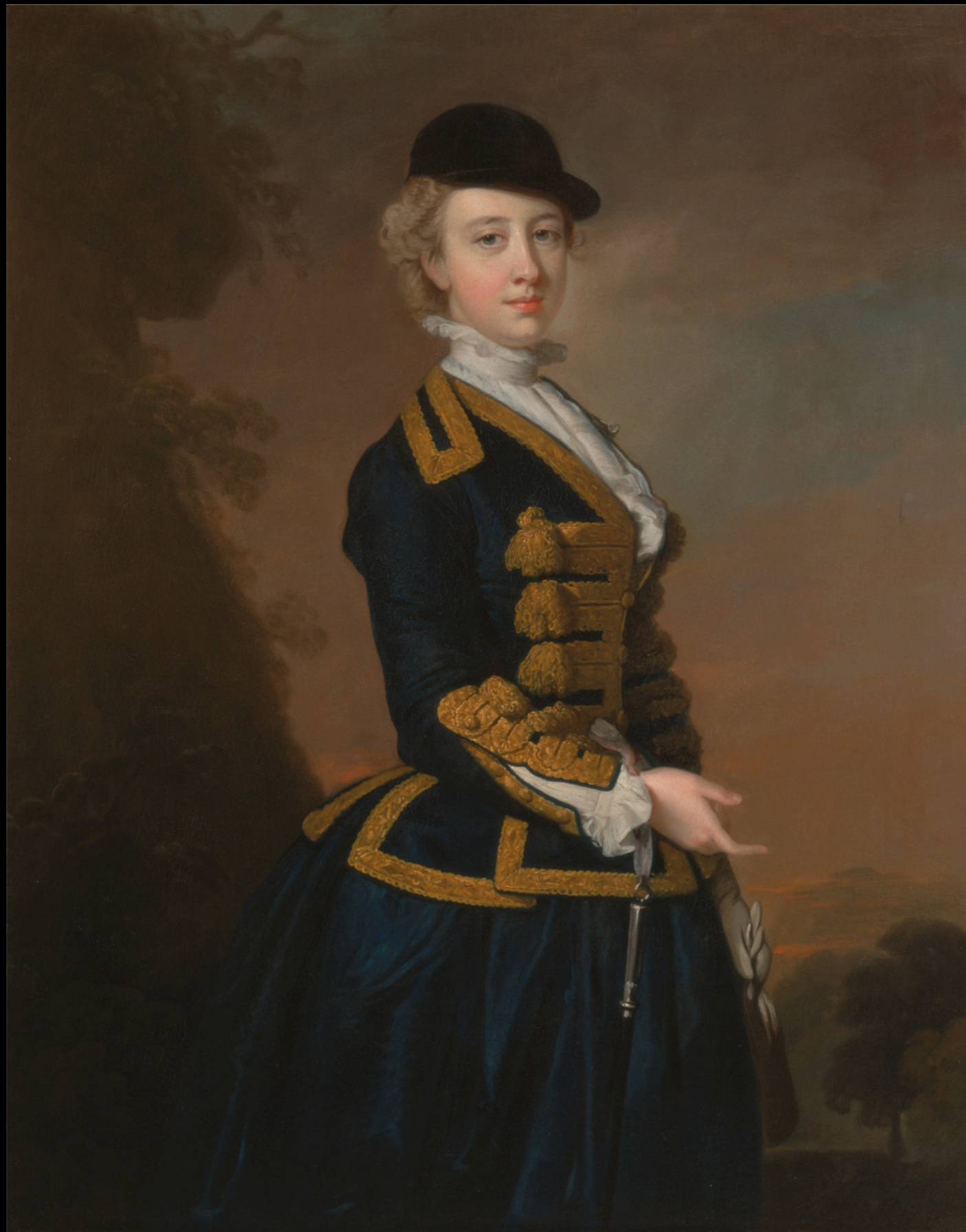
Young Woman of the Fortesque Family of Devon by Thomas Hudson c. 1745 (Yale Center for British Art)