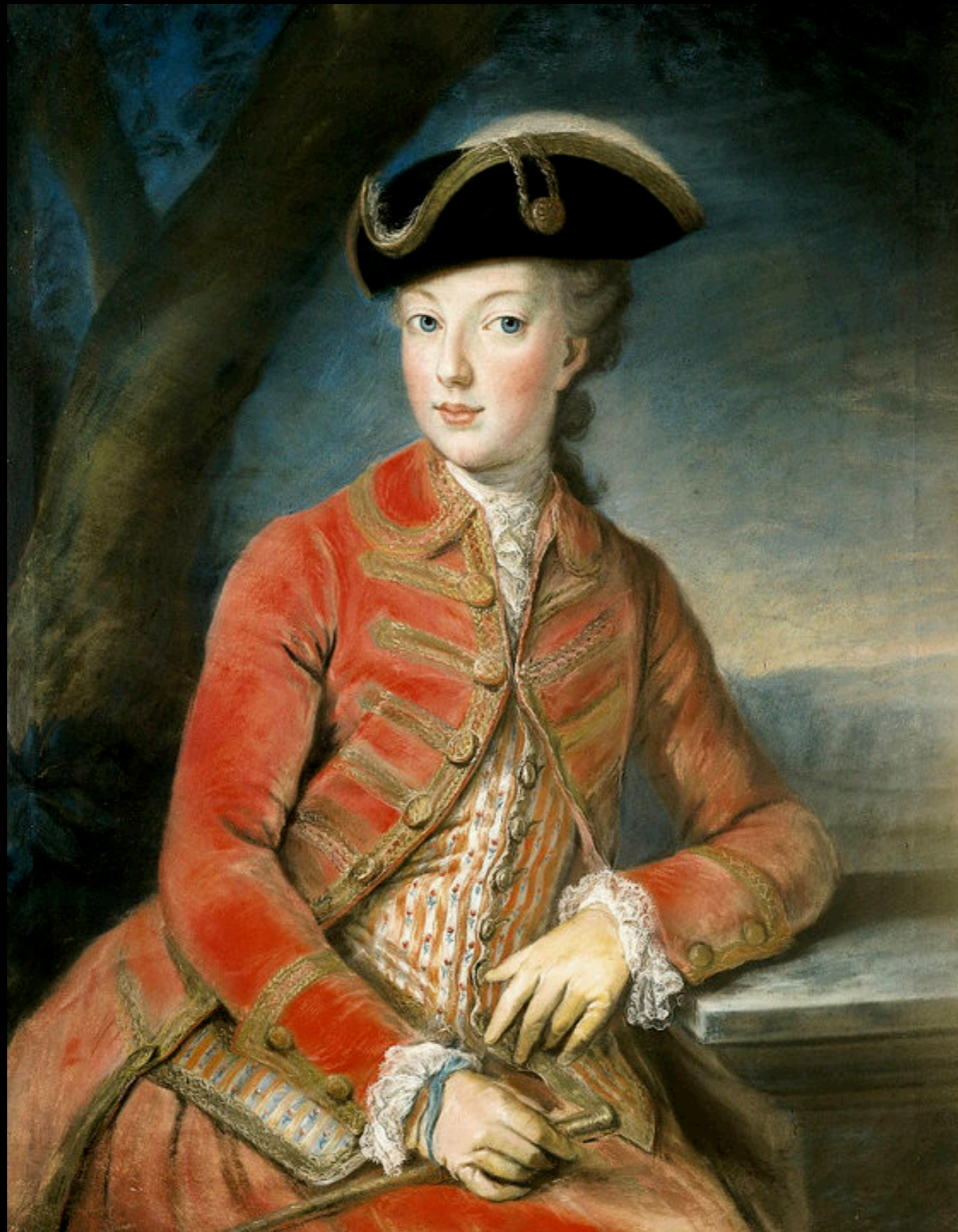
Marie Antoinette by Joseph Kreutzinger c. 1771