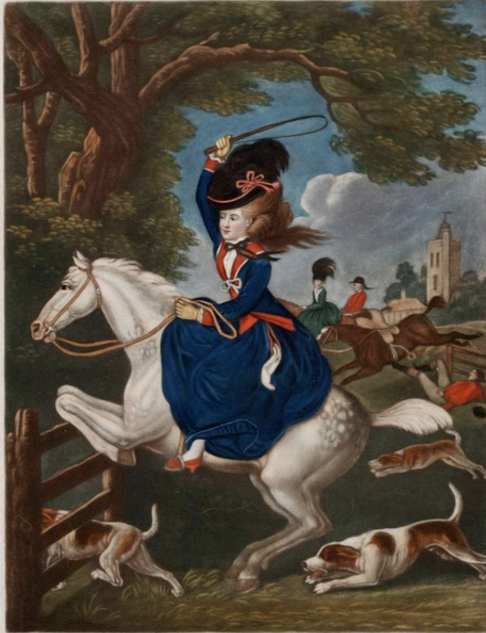
The FEMALE FOX HUNTER.

From the Original Picture by John Collet, in the possession of the Proprietors.