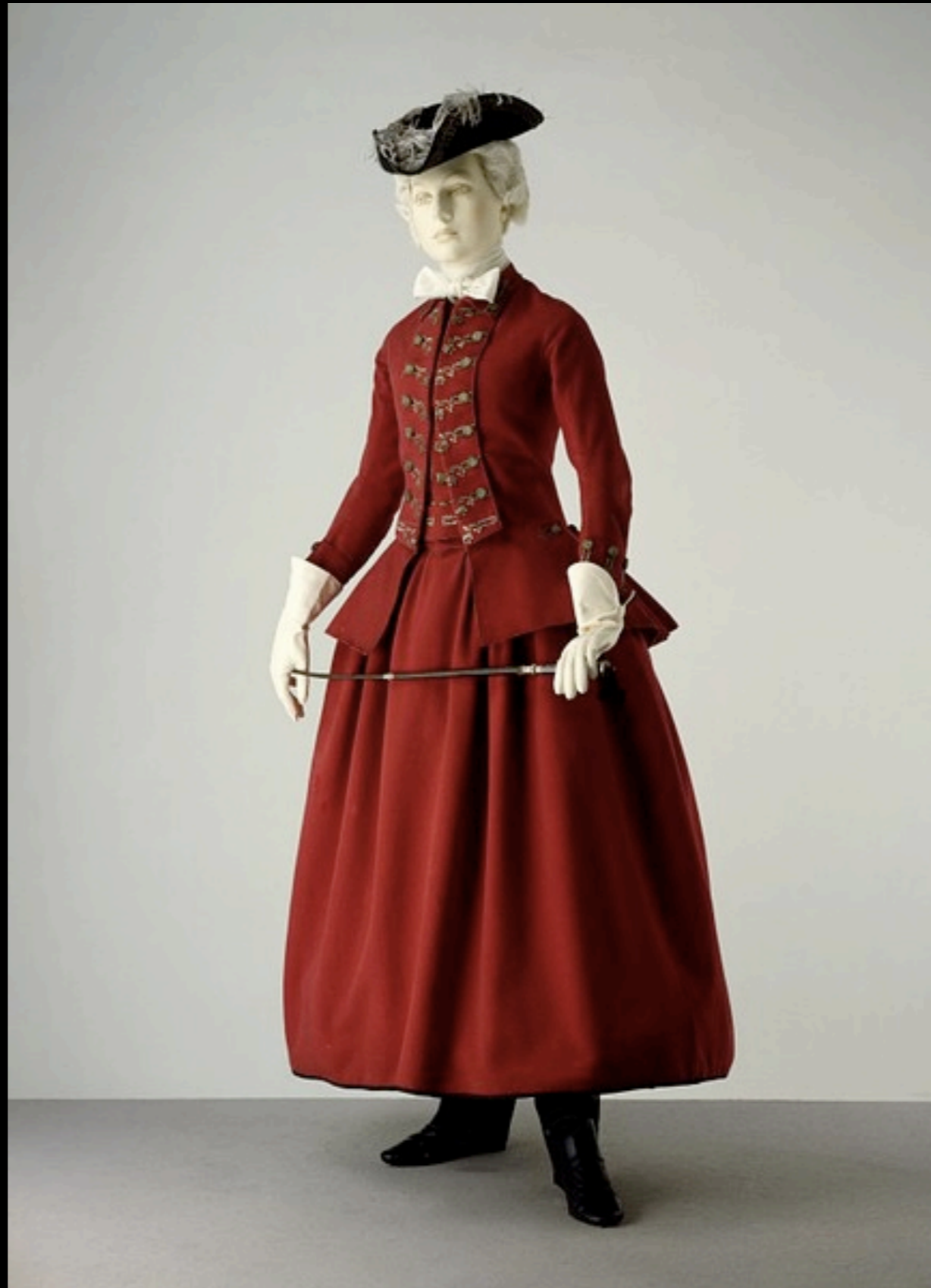
English Riding Habit 1770 - 1775 (Victoria & Albert)