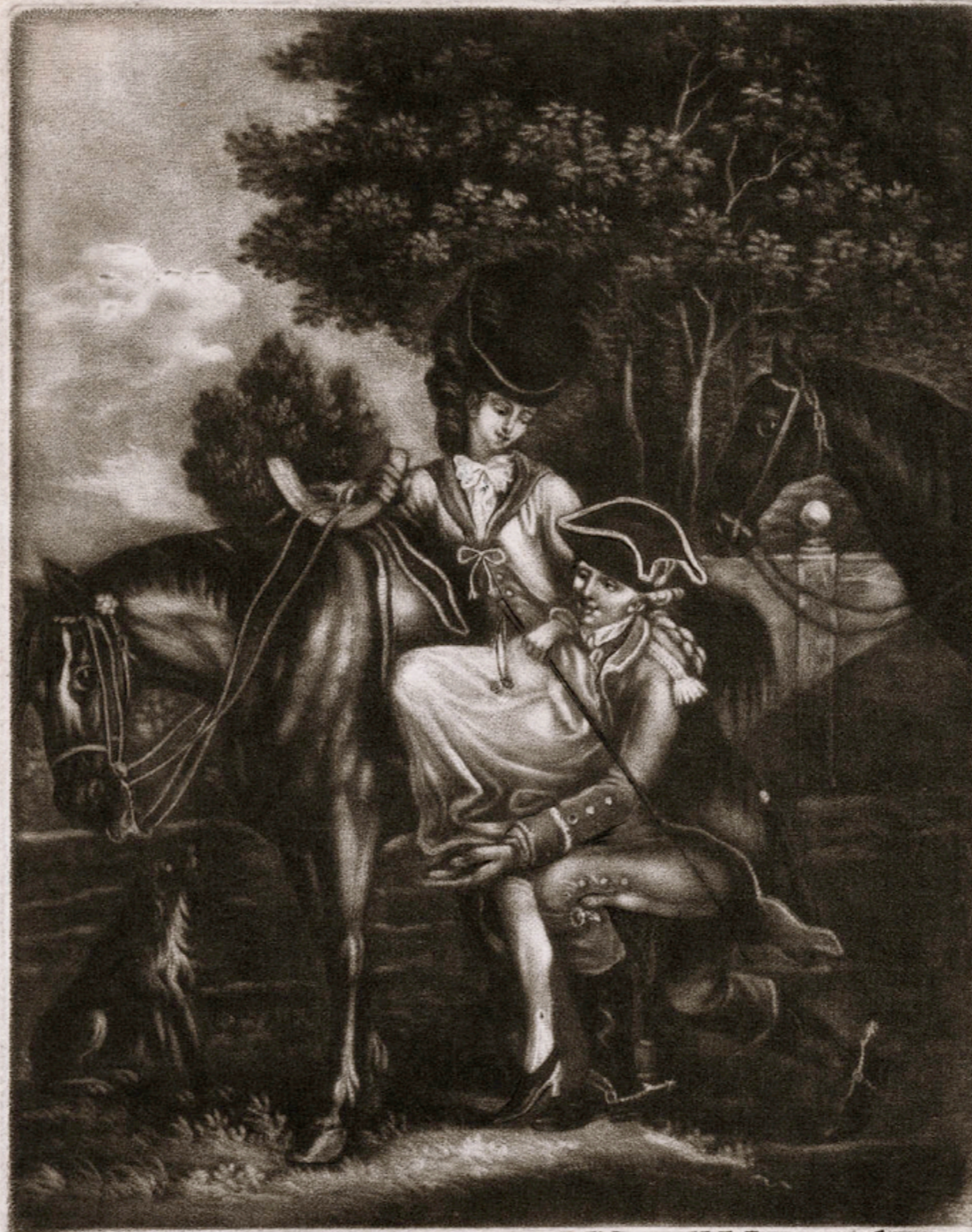
The Favourite Footman or Miss well Mounted.