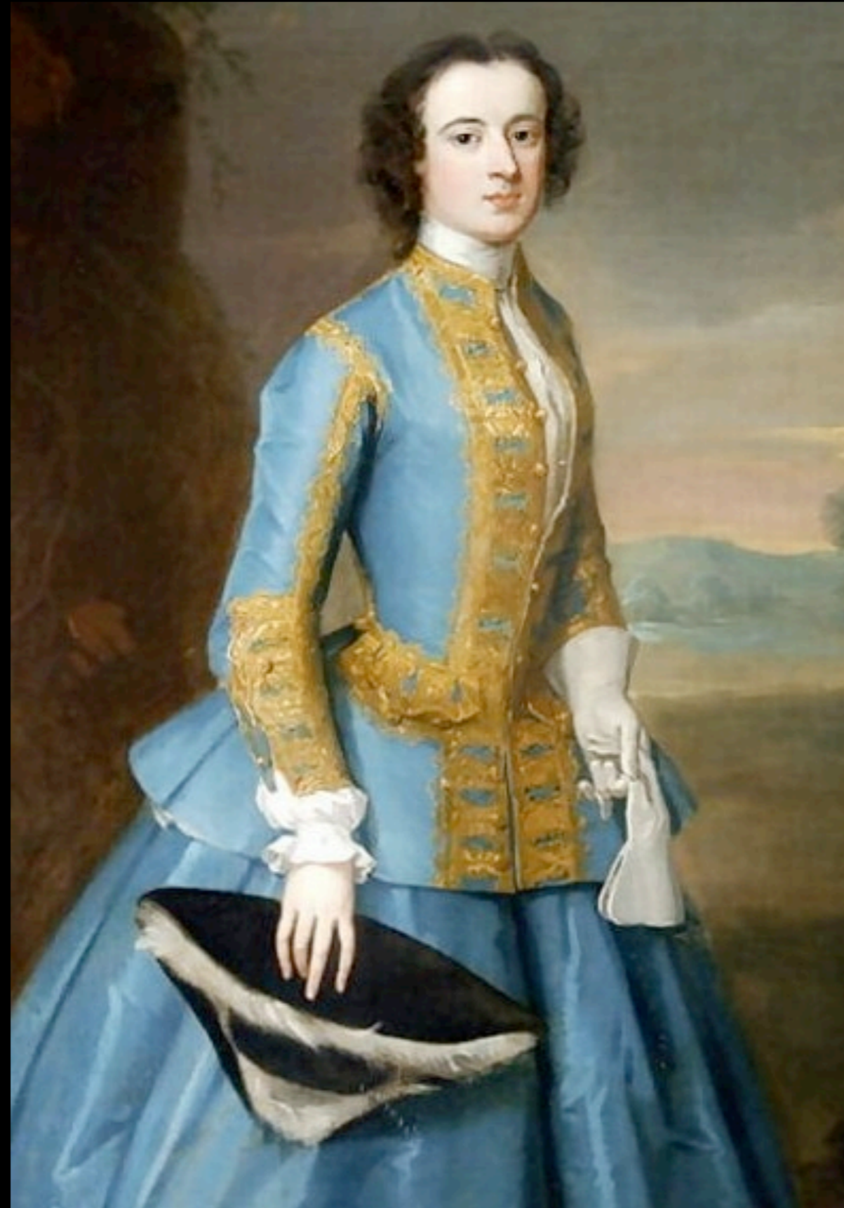
"A Lady in a Riding Habit" by Enoch Seeman c. 1725