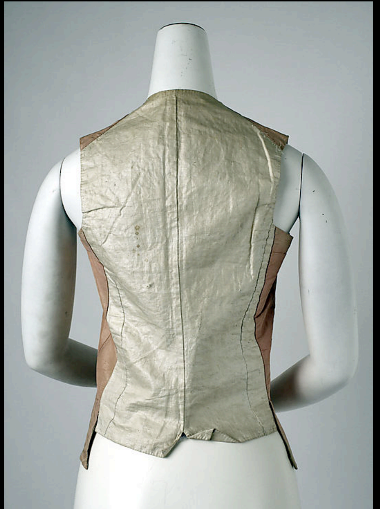
Riding Waistcoat of Silk & Linen