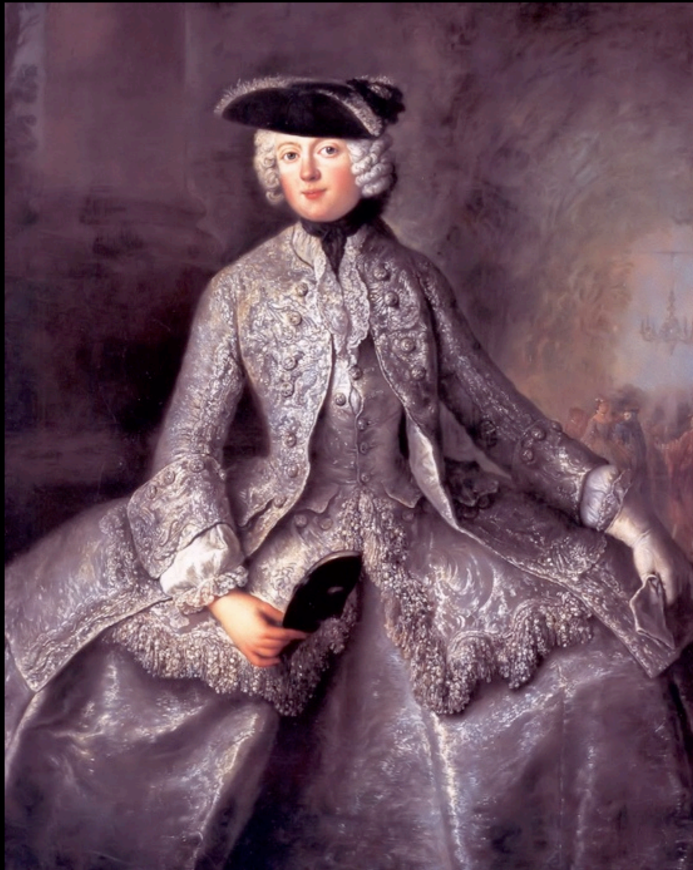
Prinzessin Amalia von Preussen by Antoine Pesne pre - 1757