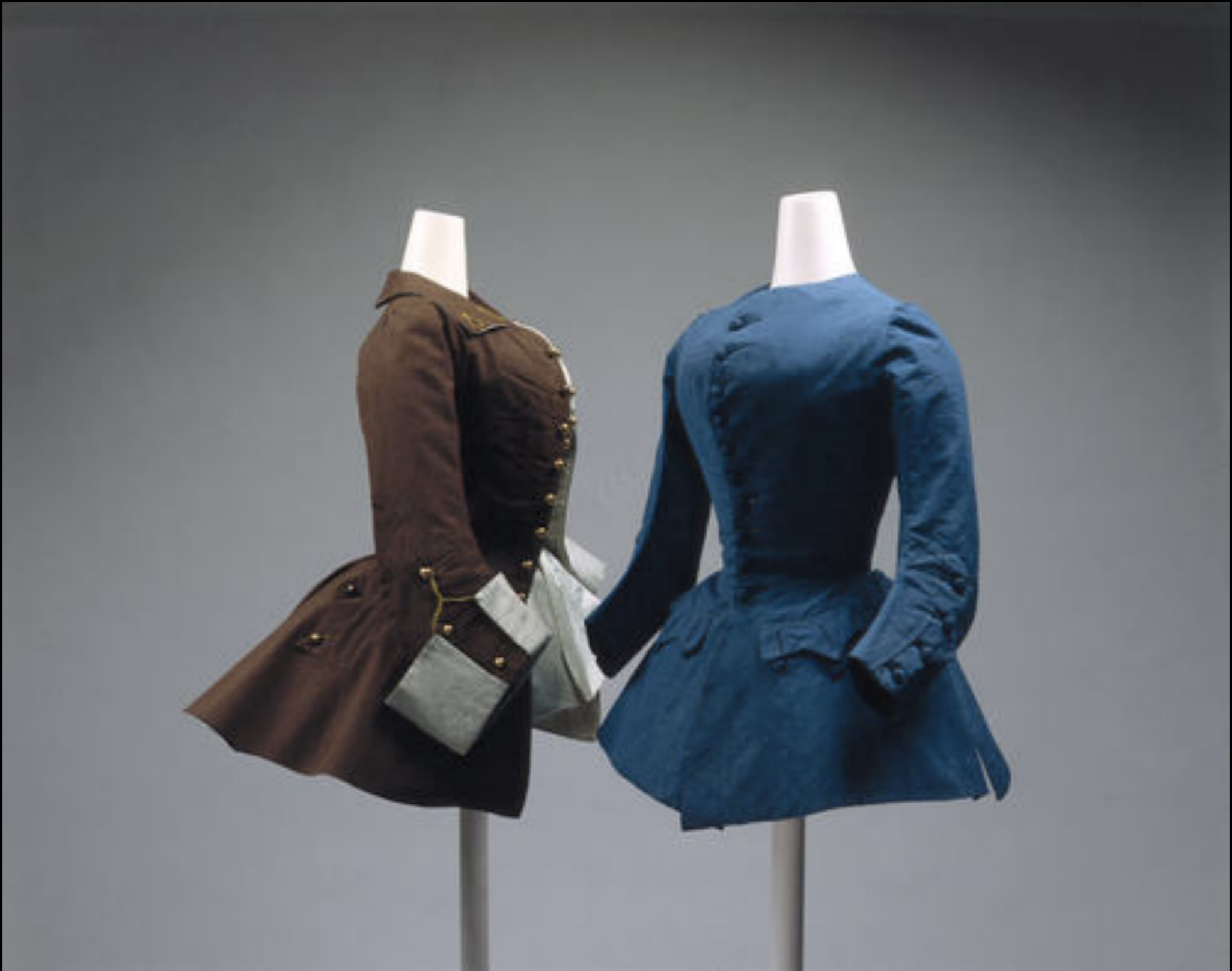
Riding Habits c. 1760 (Metropolitan Museum of Art)