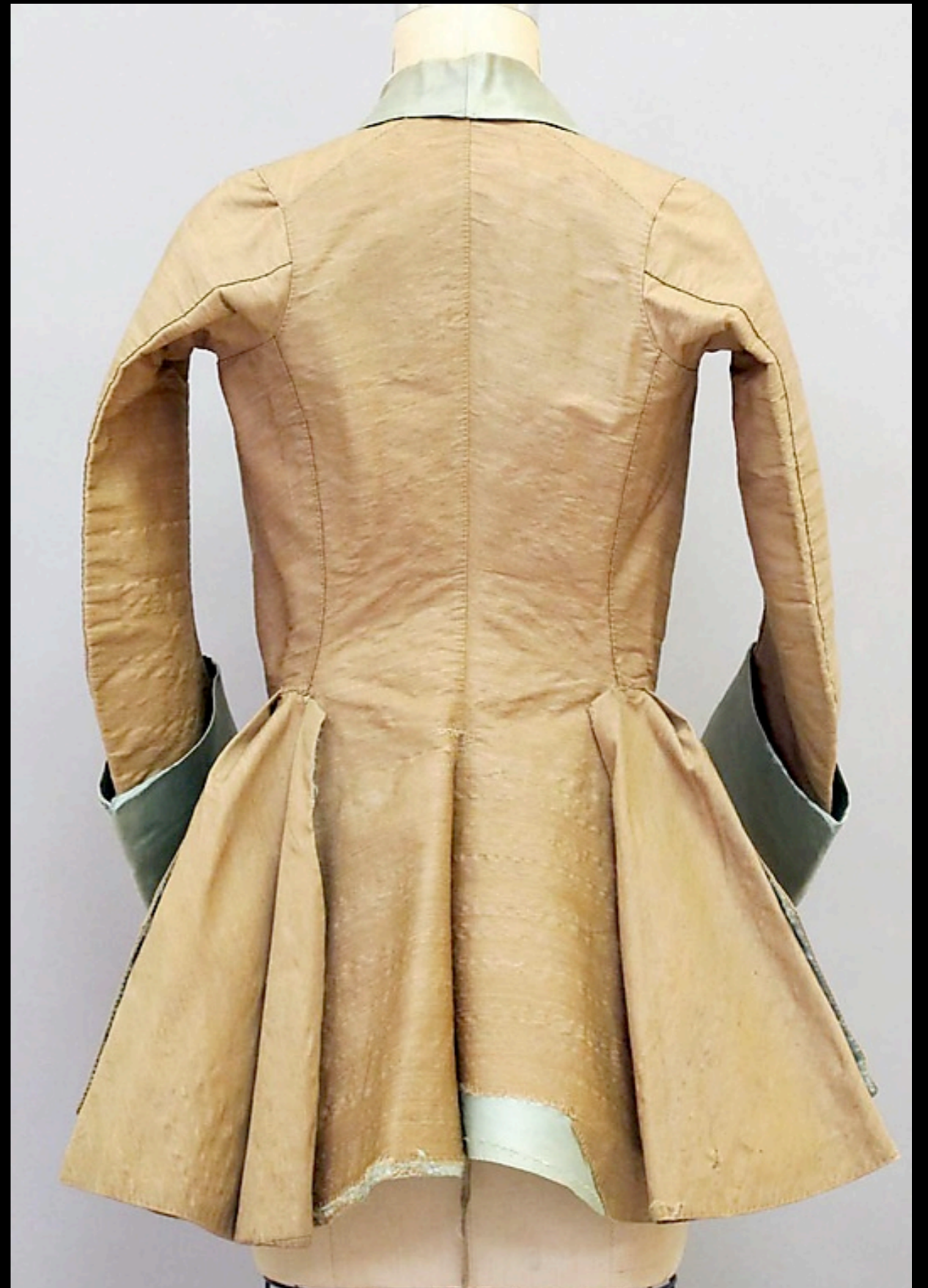
French Riding Habit (Metropolitan Museum of Art)