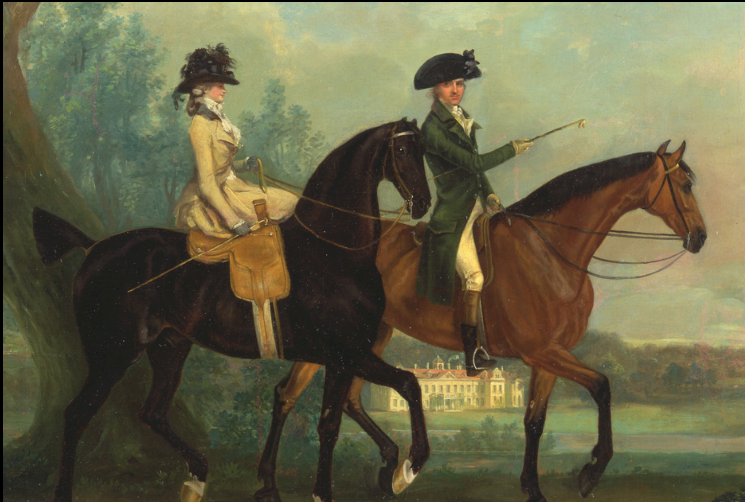
Marcia Pitt and Her Brother George Pitt, Later 2nd Baron Rivers, Riding in the Park at Stratfield by Thomas Gooch c. 1782 (Yale Center for British Art)