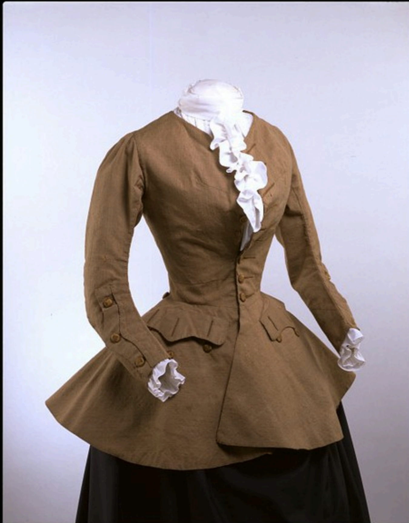
Riding Habit 18th Century