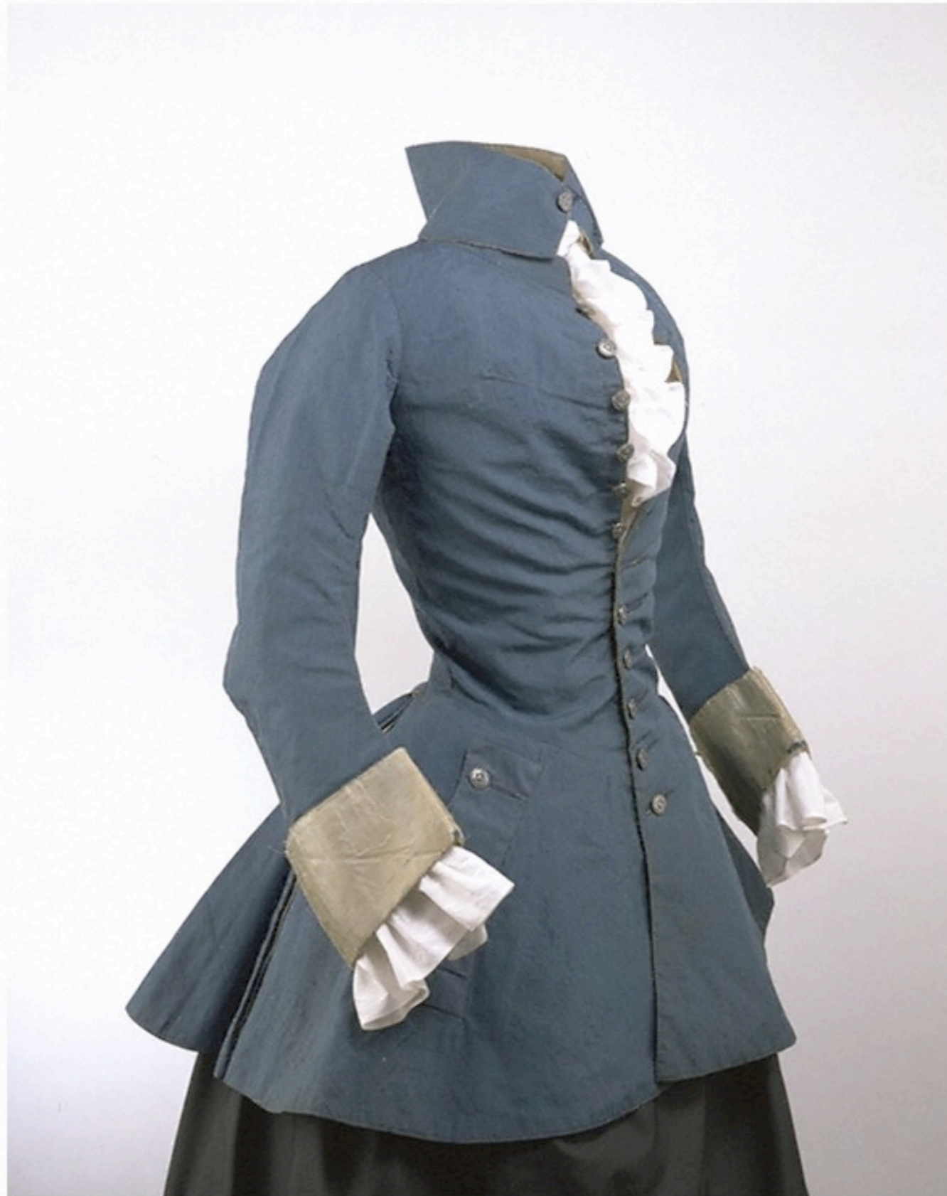
English Riding Habit