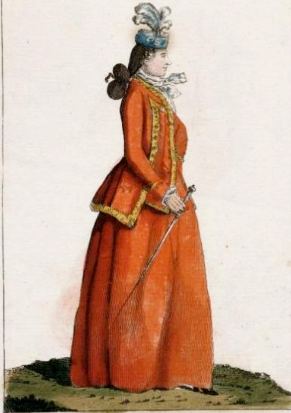
THE FEMALE TURF MACARONI.

Pub d by M Darly Decem r 24 th 1771 accor d to Act.