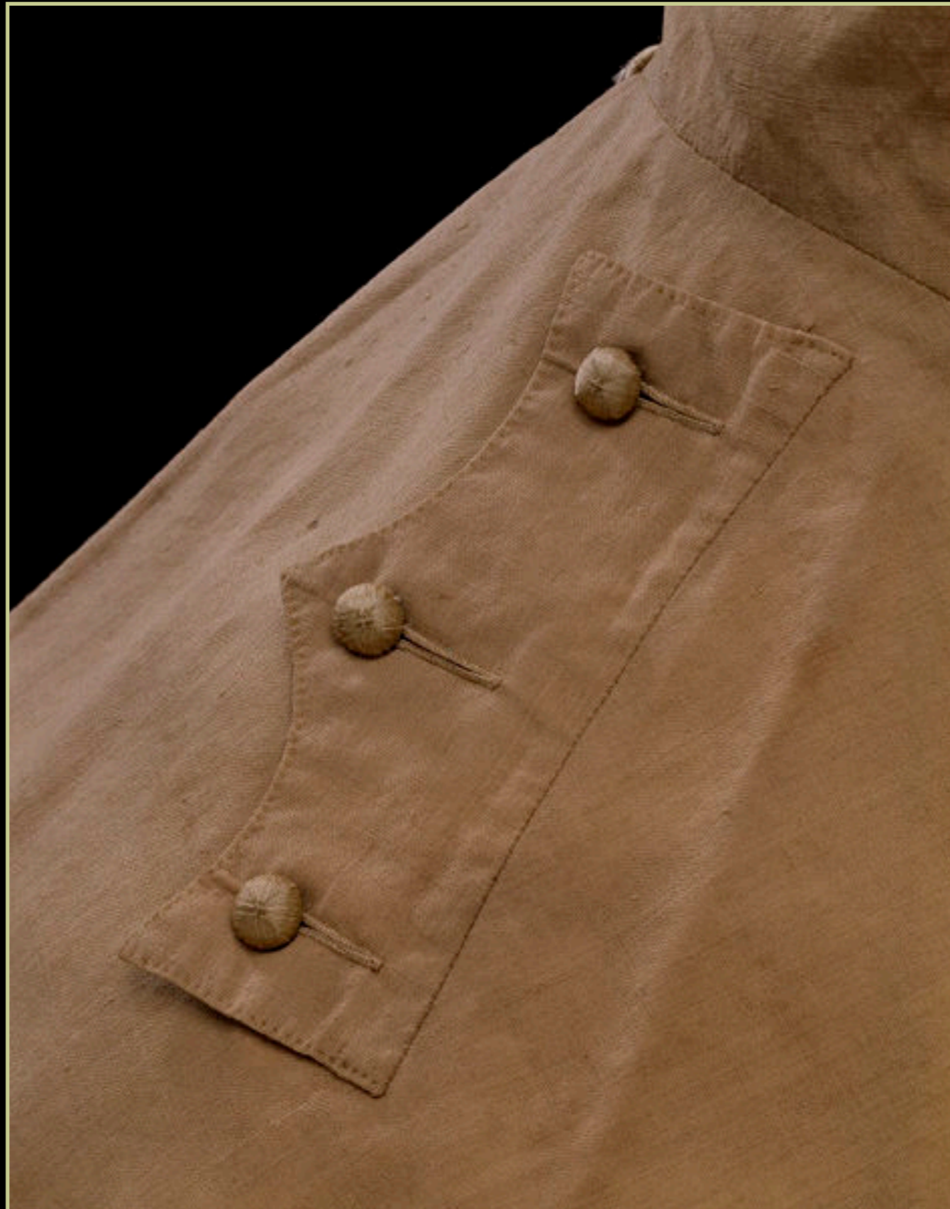
Detail: Riding Habit c. 1760 (Victoria & Albert)