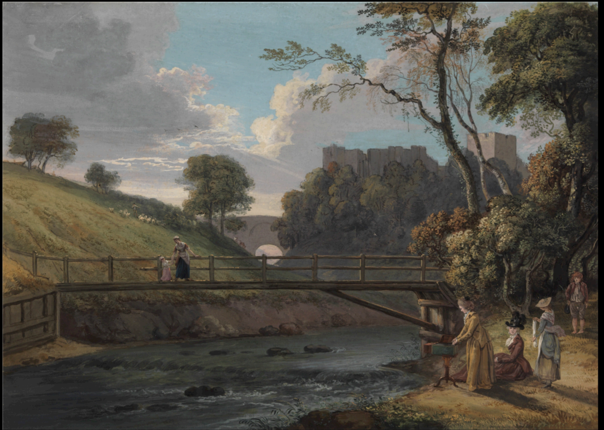
Roslin Castle, Midlothian Paul Sandby c. 1780