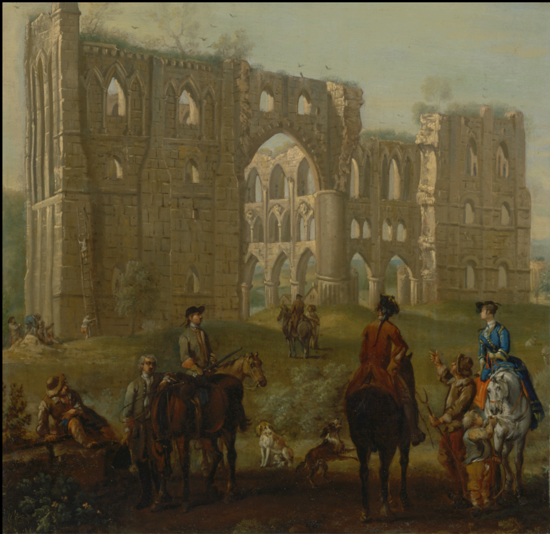
Rievaulx Abbey by John Wootton c. 1745