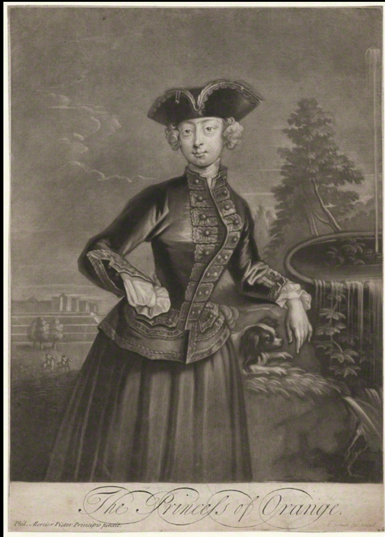
Anne, Princess of Orange by John Simon, after Philip Mercier (National Portrait Gallery)