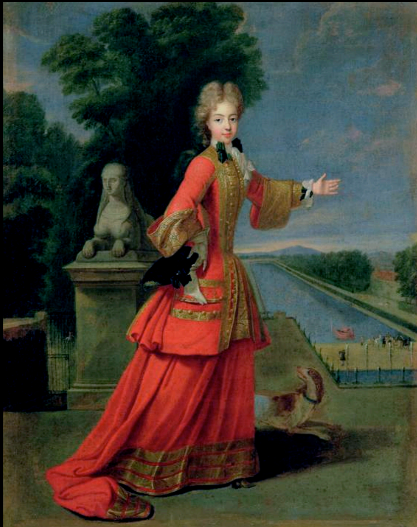
Duchess of Burgundy under Louis XIV