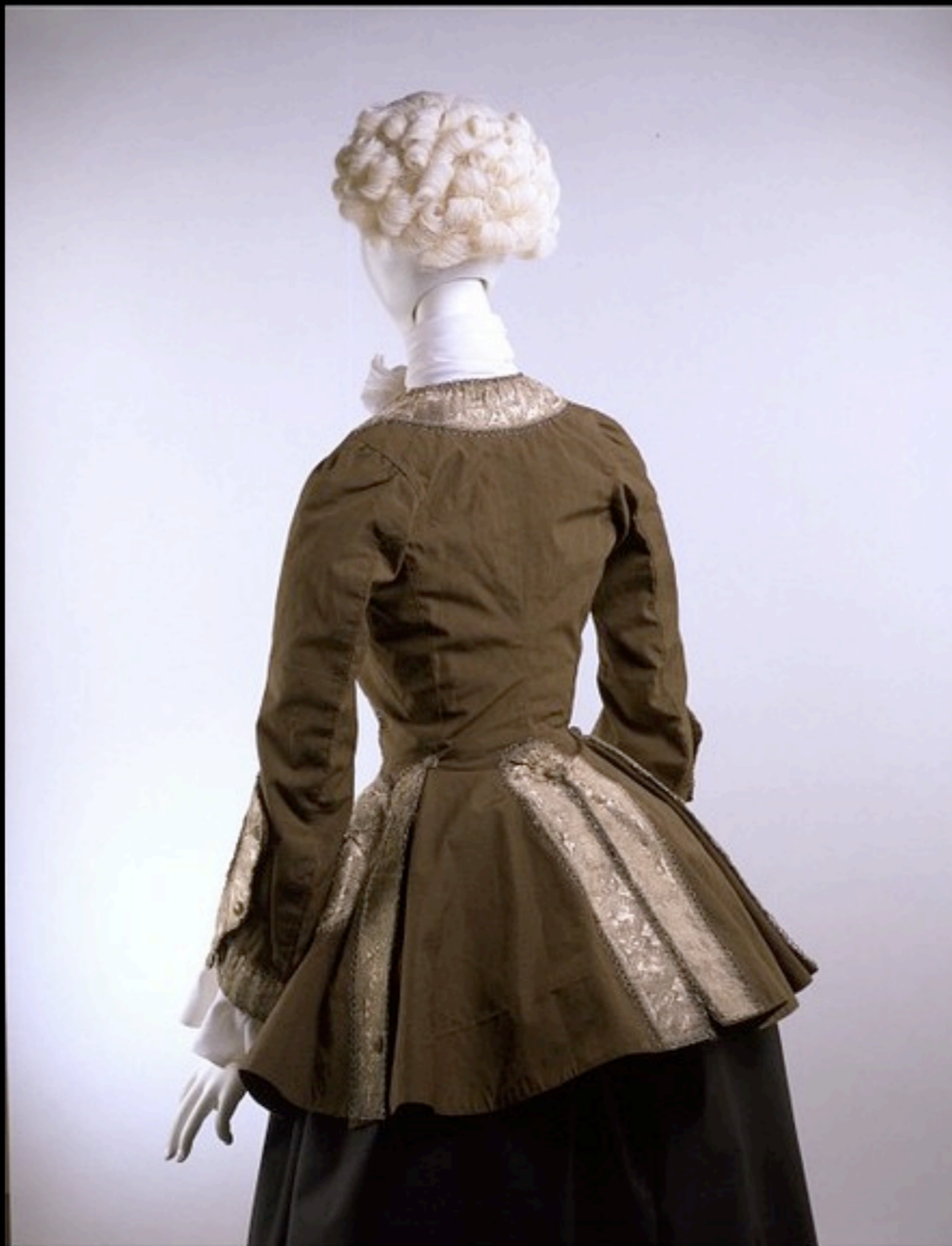
English Woven Wool & Silk Riding Habit c. 1750 - 1759 (Victoria & Albert)