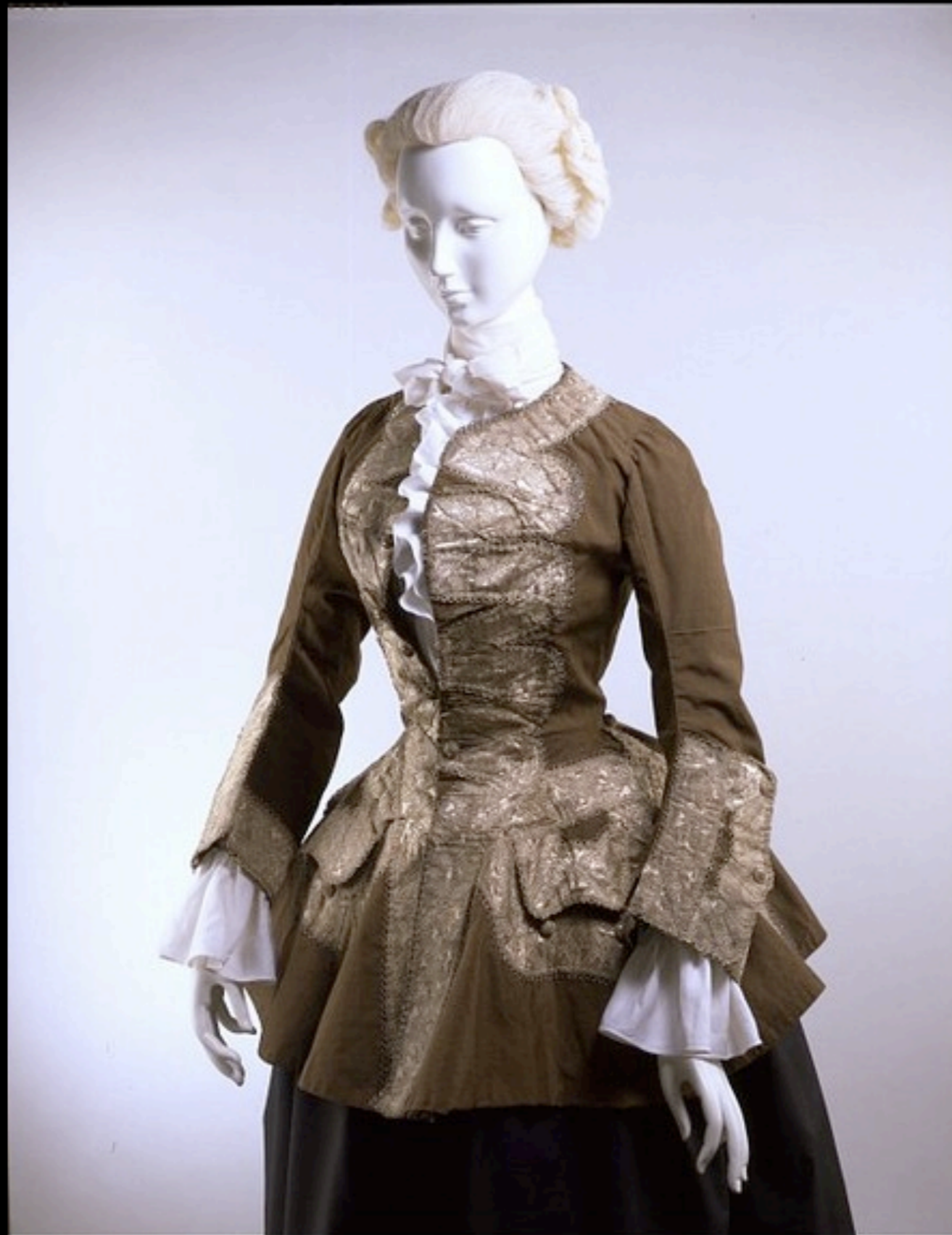
English Woven Wool & Silk Riding Habit c. 1750 - 1759 (Victoria & Albert)