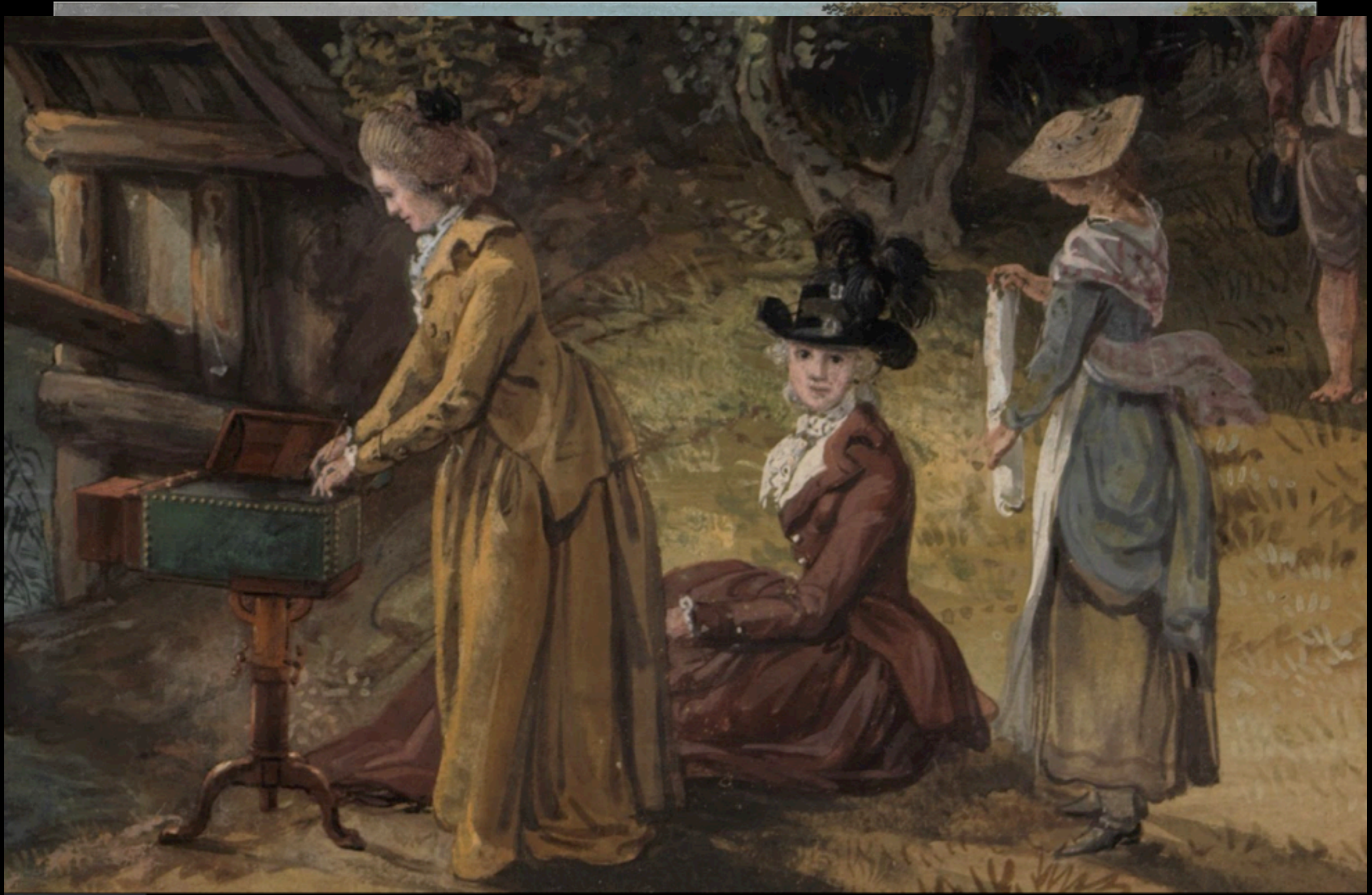
Roslin Castle, Midlothian Paul Sandby c. 1780 (Yale Center for British Art)