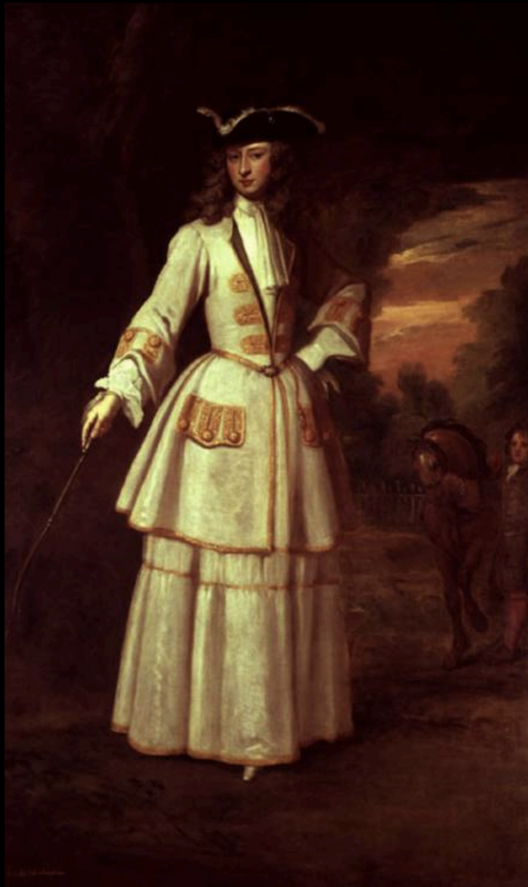
Henrietta Cavendish, Lady Huntingtower by Kneller 1715 (Metropolitan Museum of Art)