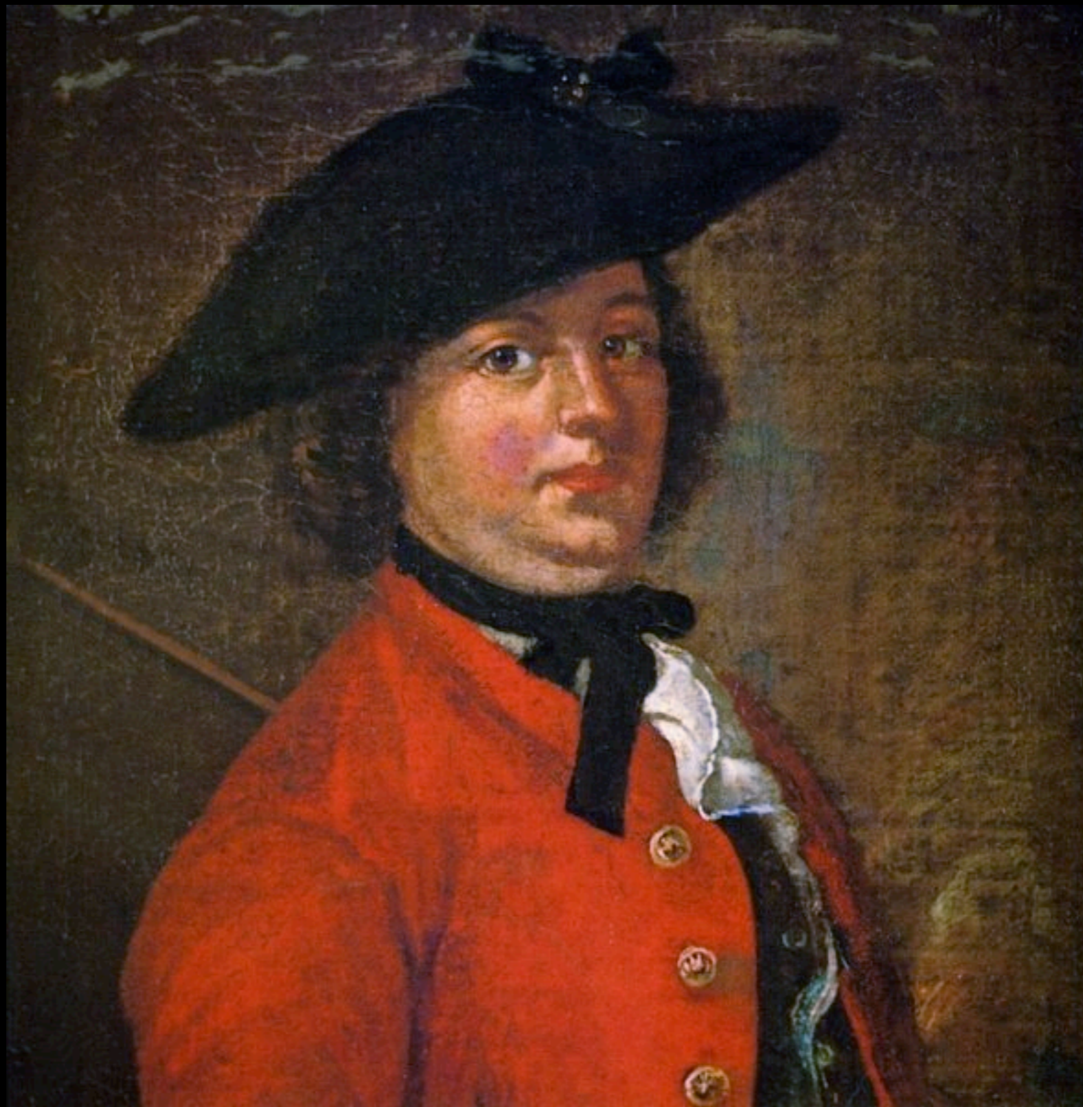
Hannah Snell, the Female Soldier by English School