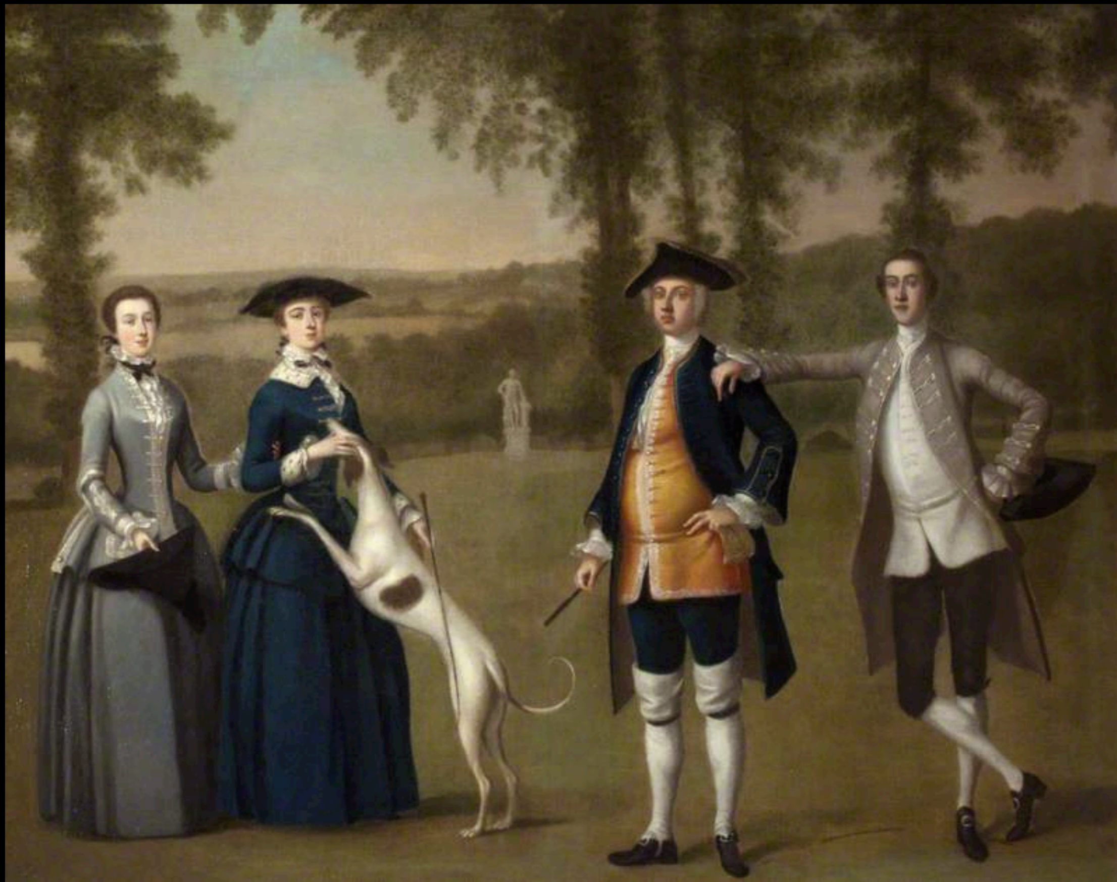
The Trevelyan Conversation Piece by Arthur Devis c. 1740