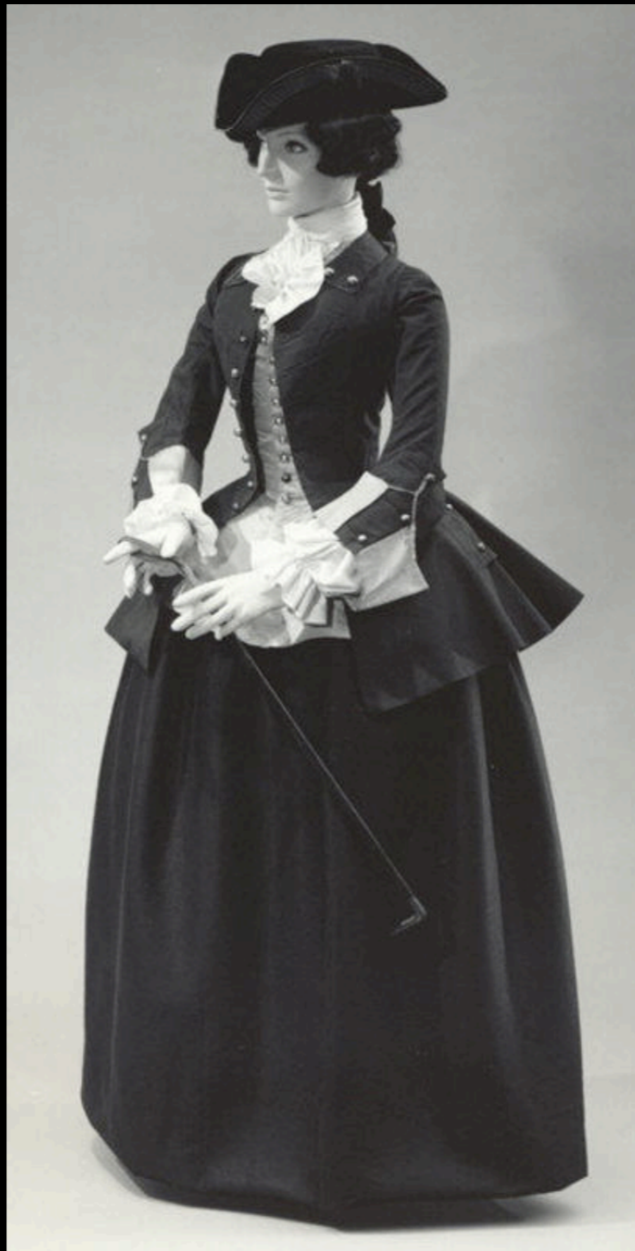
Riding Habit (Metropolitan Museum of Art)