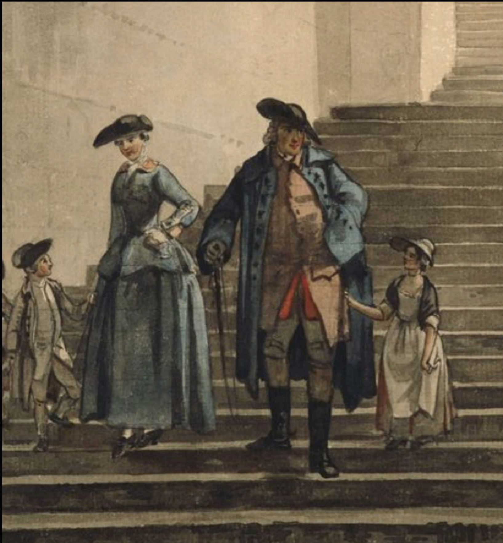
Winsor: The Ascent to the Round Tower Paul Sandby c. 1770 (National Gallery of Scotland)