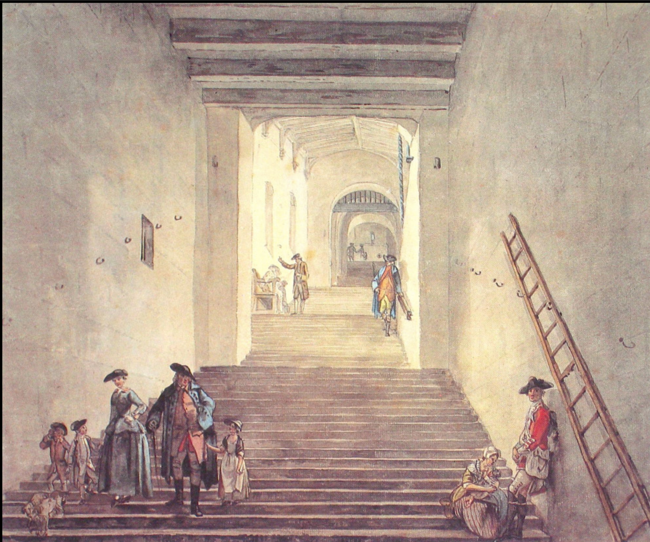
Winsor: The Ascent to the Round Tower Paul Sandby c. 1770 (National Gallery of Scotland)