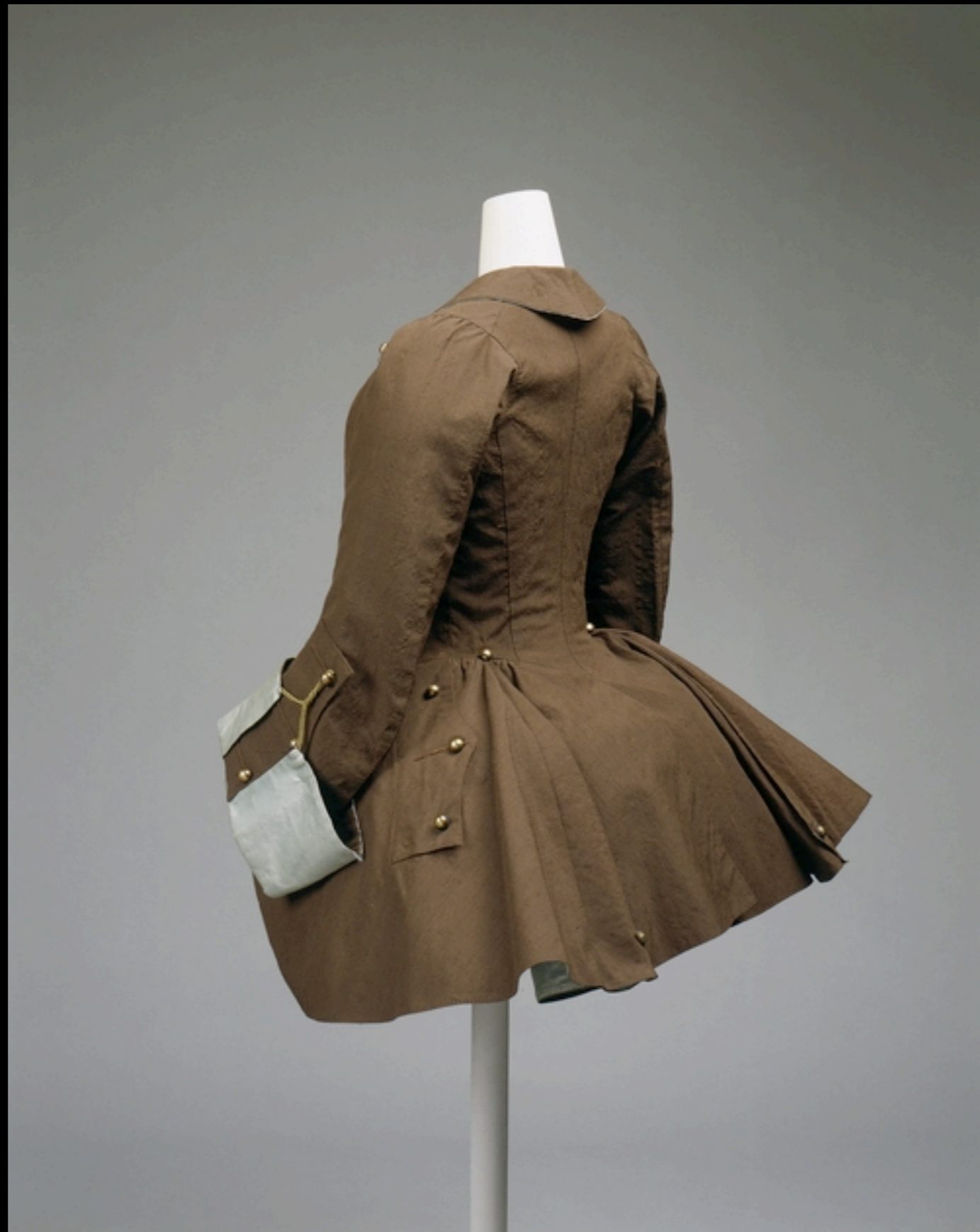
English Silk & Goat Hair Riding Habit c. 1760 (Metropolitan Museum of Art)