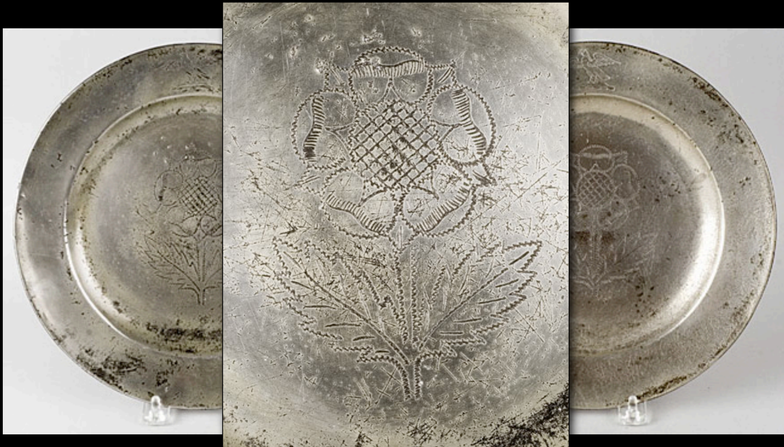
An English Pair of Pewter Plates with Wriggle Thistle Design By Samuel Ellis of London c. 1750 (Private Collection)