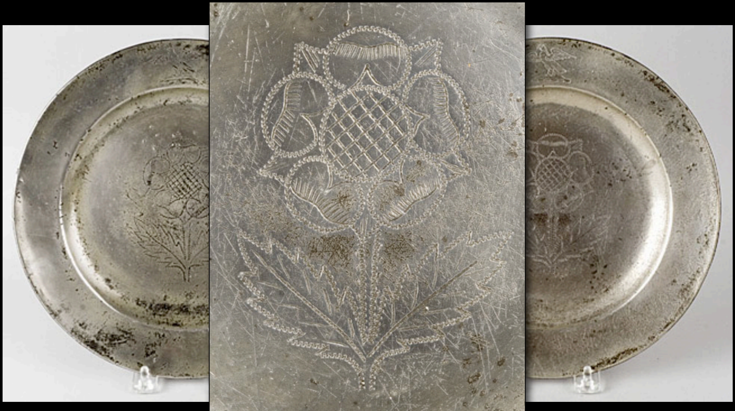
An English Pair of Pewter Plates with Wriggle Thistle Design By Samuel Ellis of London c. 1750 (Private Collection)