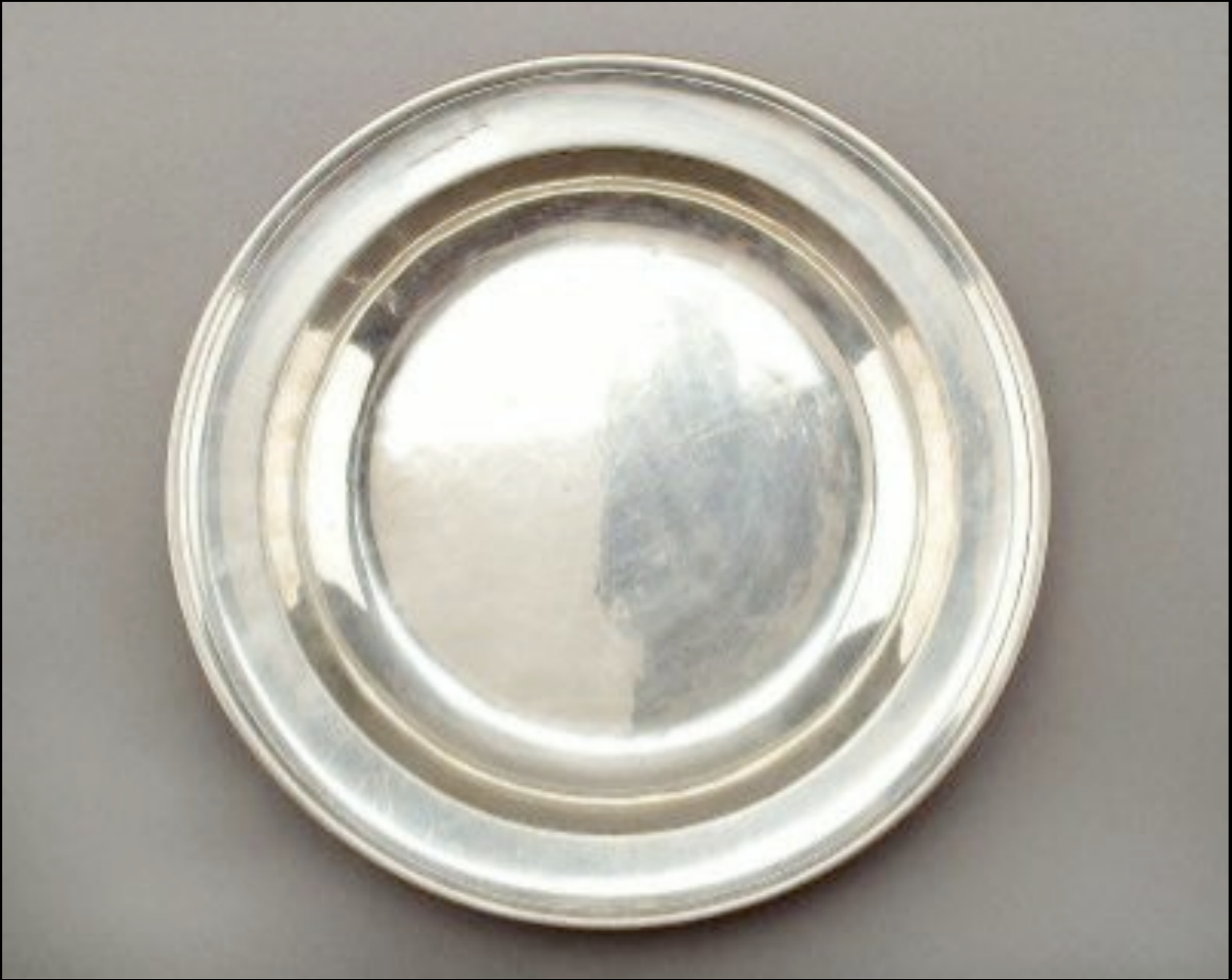
English Pewter Plate by "Jones" c. Early 18th Century (Museum of Fine Arts, Boston)