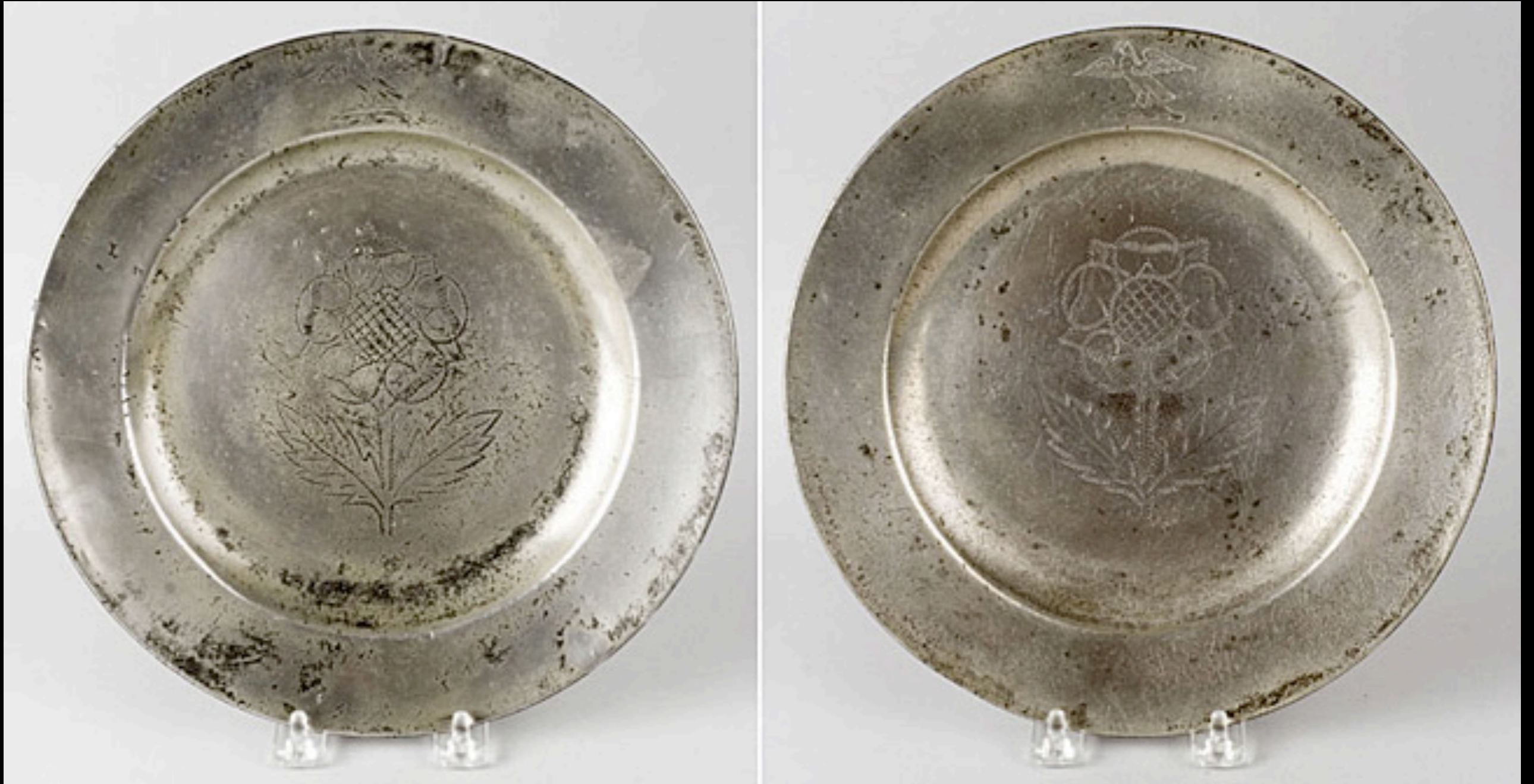
An English Pair of Pewter Plates with Wriggle Thistle Design By Samuel Ellis of London c. 1750 (Private Collection)