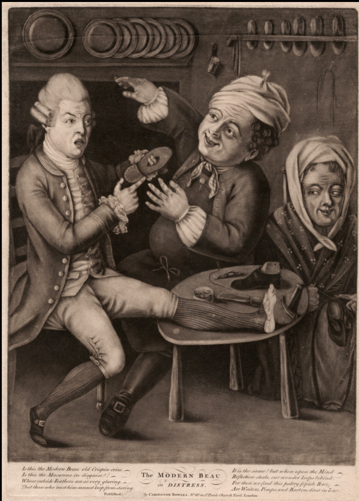
“The MODERN BEAU in DISTRESS” by Carington Bowles (Yale Center for British Art)