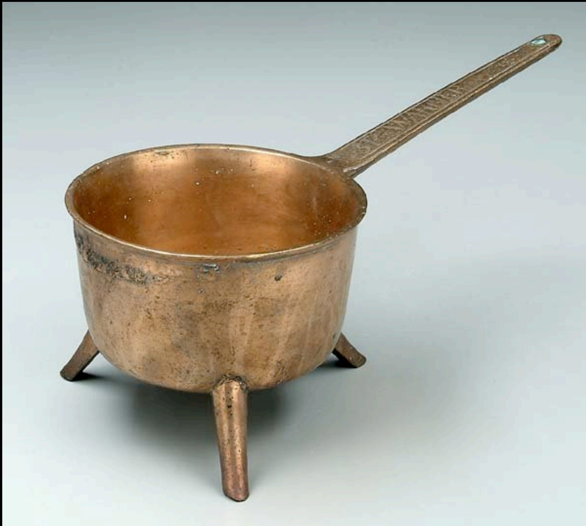
American or British Bell Metal Posnet Marked "SB Warner" 18th Century (Private Collection)