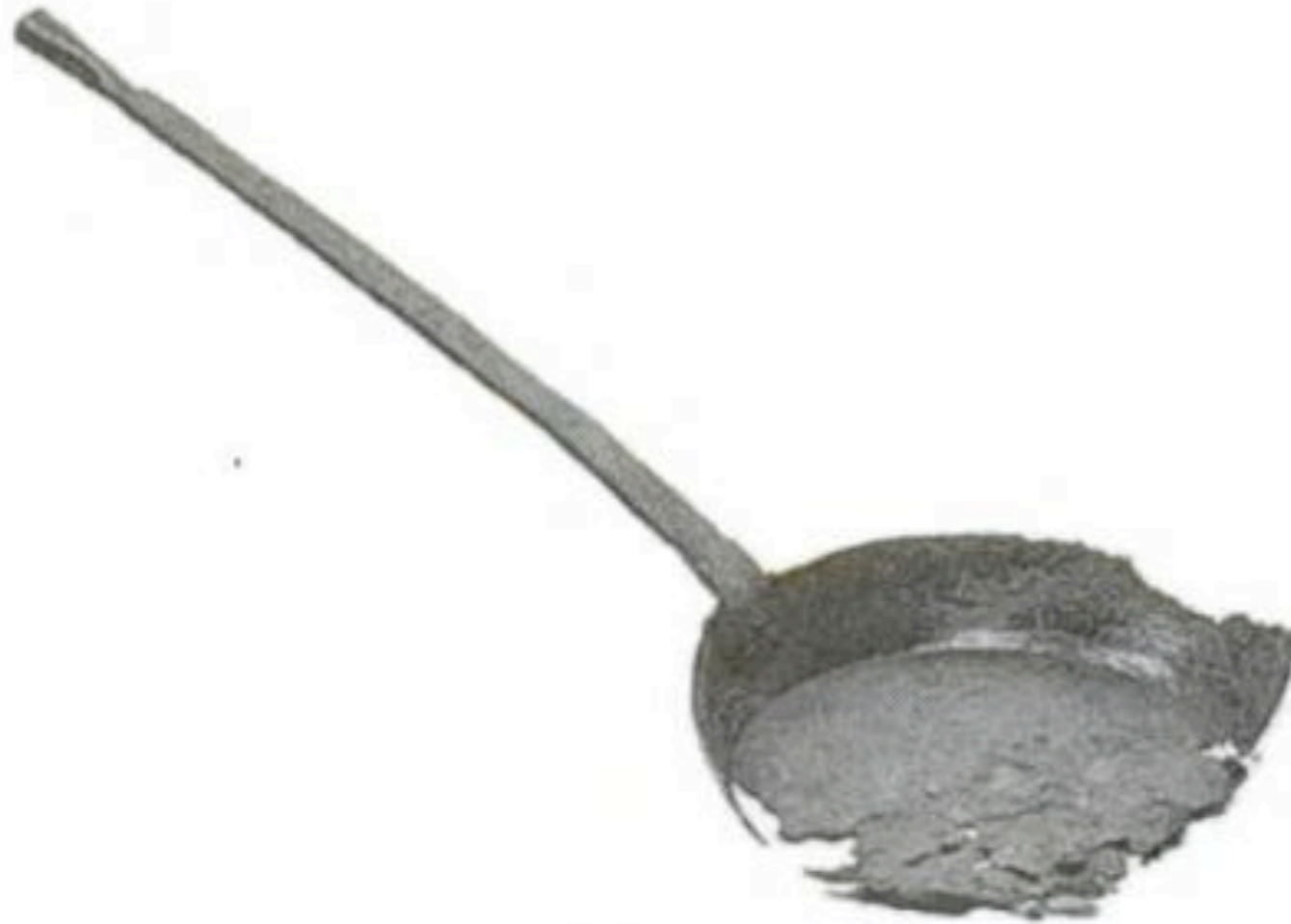
Fig. A.57. Long-handled iron skillet.

Sheet Iron Skillet From the Gondola, Philadelphia, Sunk on Lake Champlain 1776 (Smithsonian Institution)