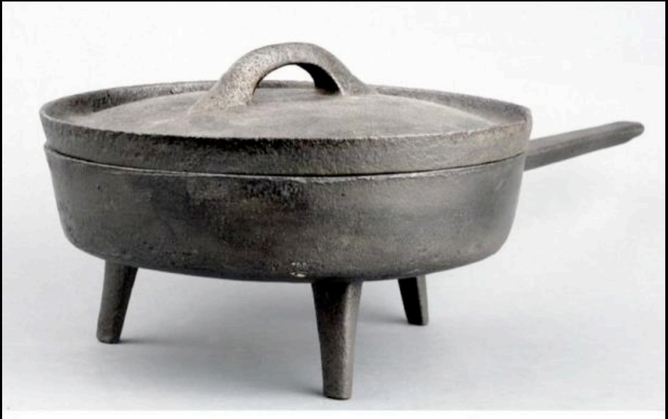
Cast Iron Skillet with Lid c. 1700 - 1800 (New York Historical Society)