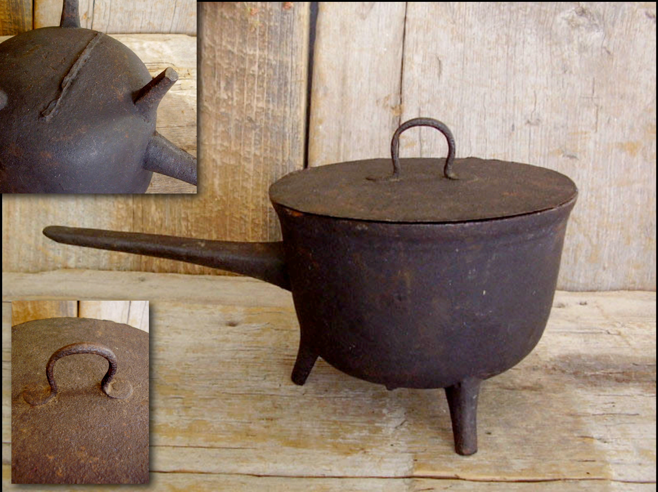
Cast Iron Lidded Posnet with a Linear Gate Mark 18th Century (Private Collection)