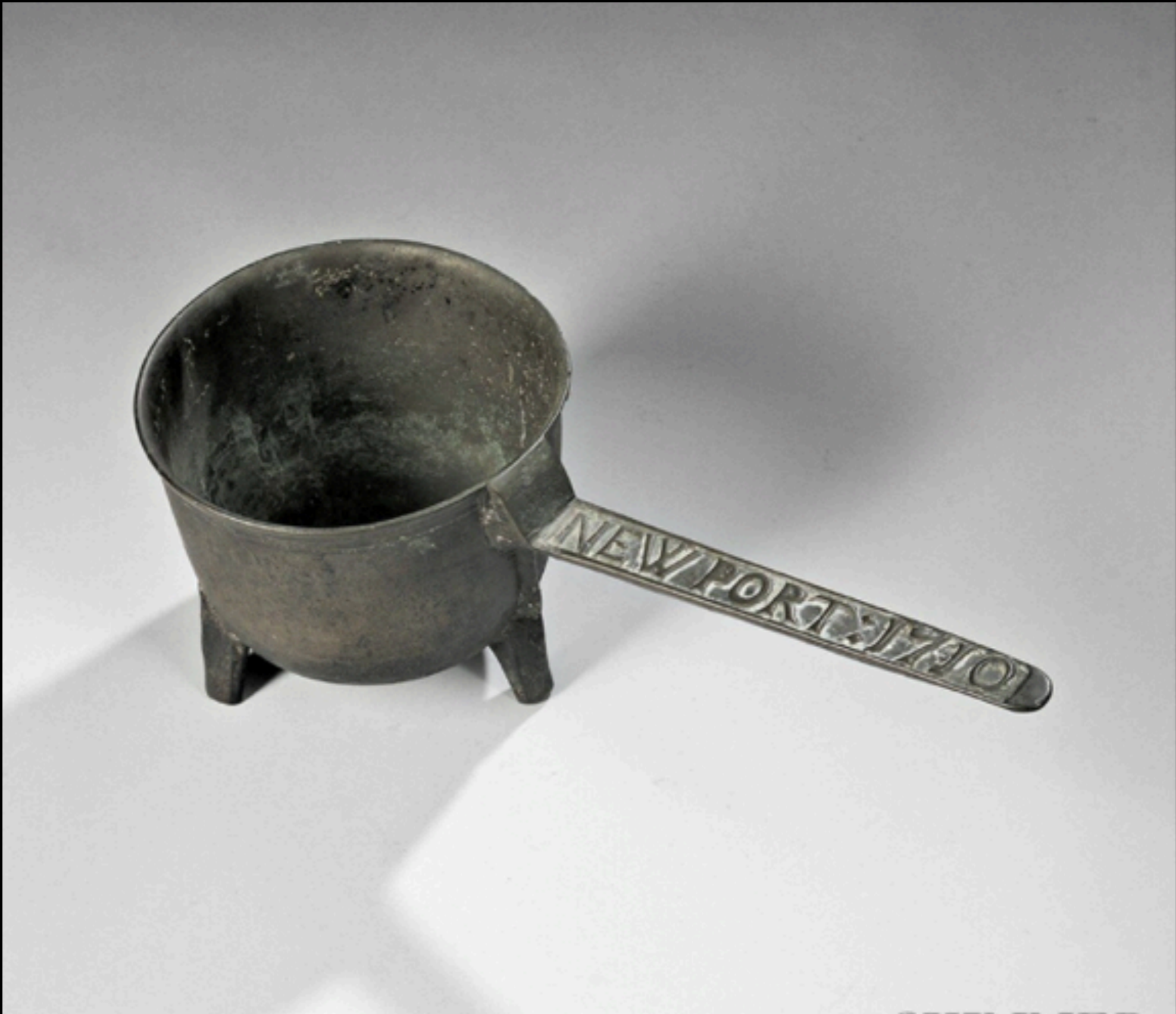
American Bell Metal Posnet Marked "NEWPORT 1710"