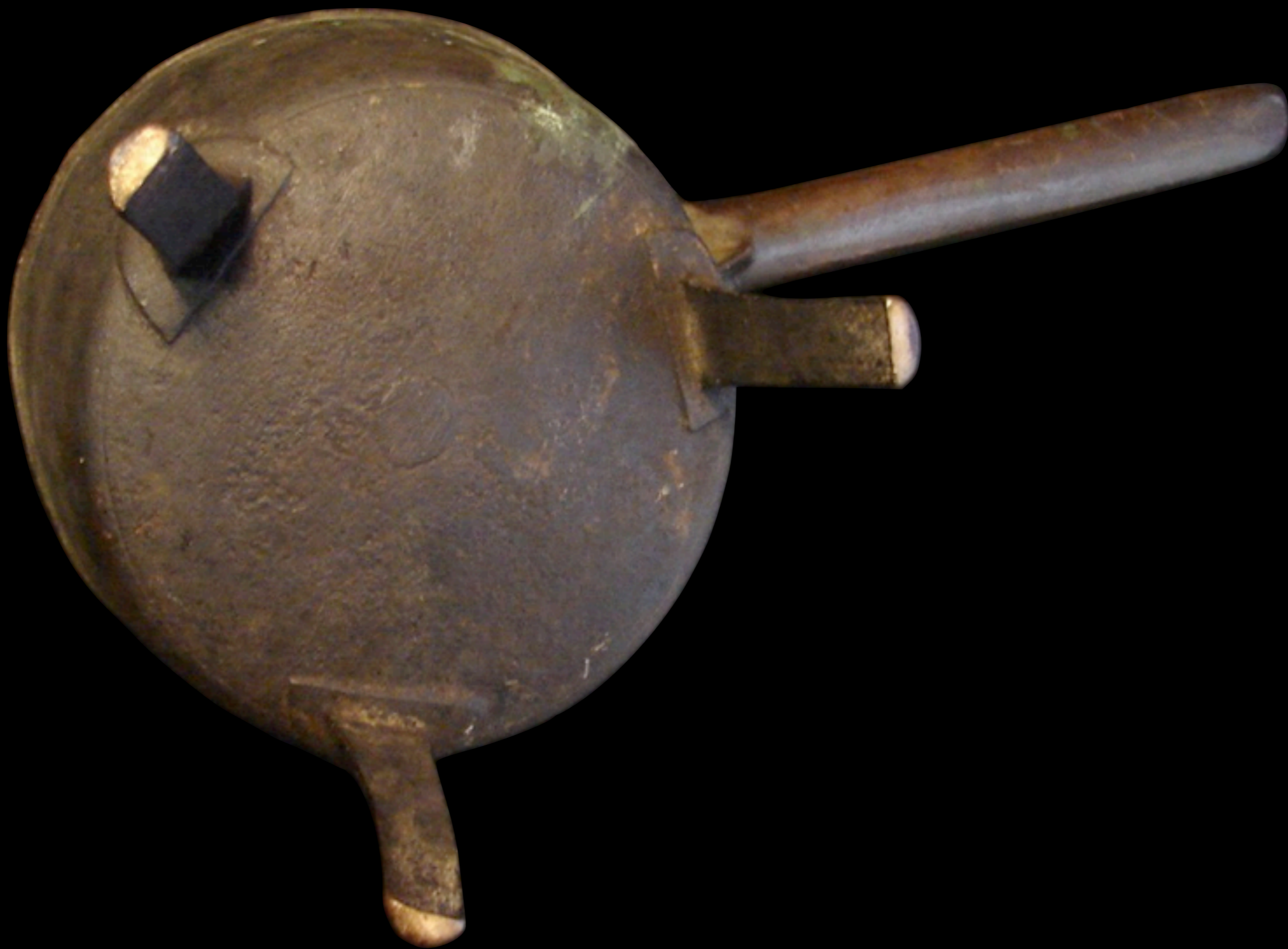
English Bronze Posnet Marked "Emerson & Co." Bristol 18th Century (Private Collection)