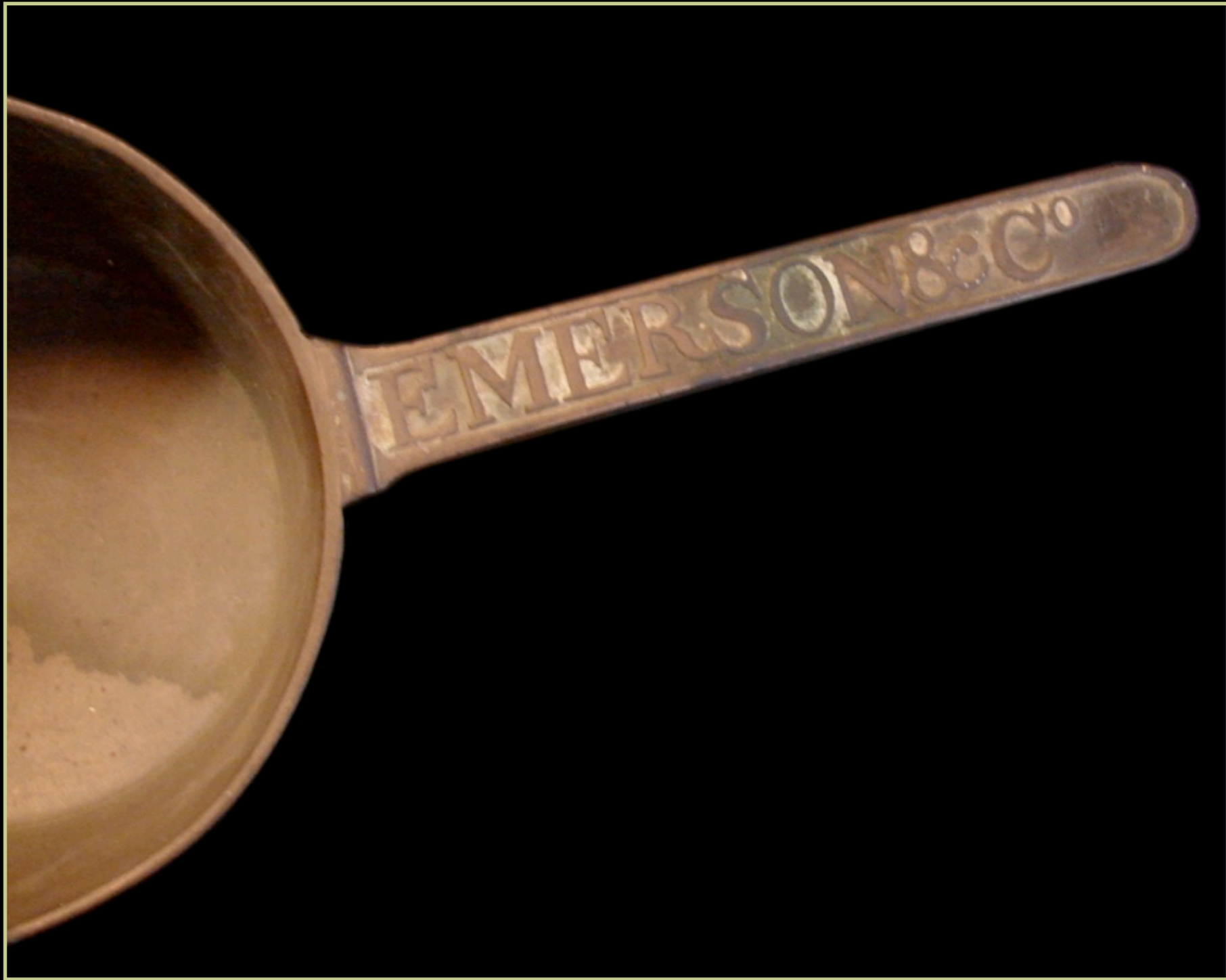
English Bronze Posnet Marked "Emerson & Co." Bristol 18th Century (Private Collection)