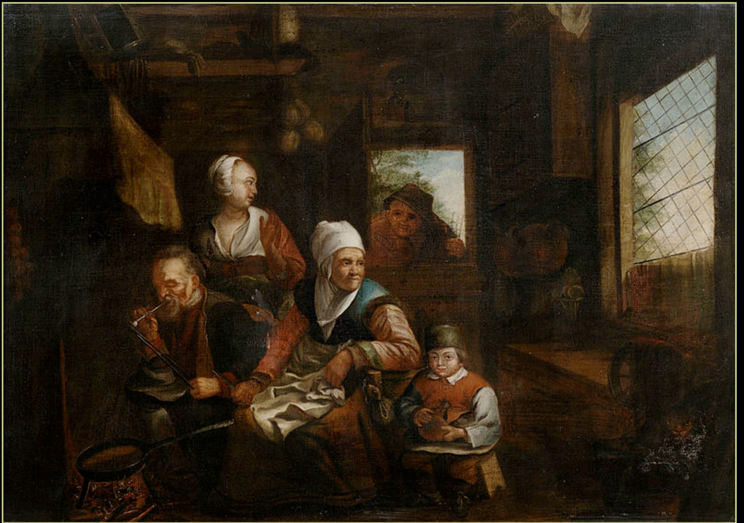
Peasant Family in the Kitchen In the style of David III Ryckaert (1612-1661) Likely 17th Century