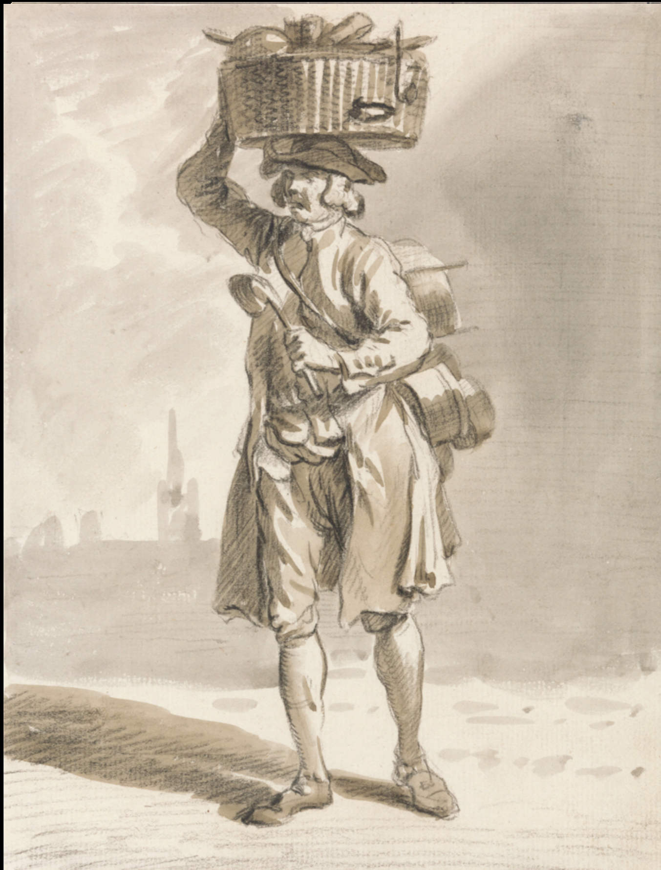
London Cries: "A Man Selling Pots & Pans"