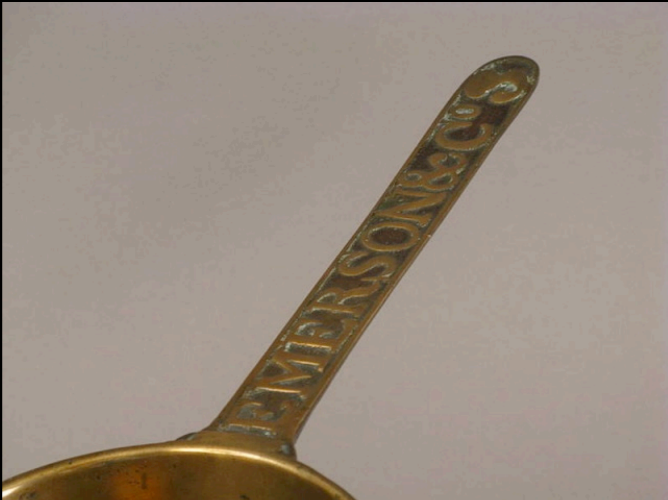
English Bronze Posnet Marked "Emerson & Co." Bristol 18th Century (Private Collection)