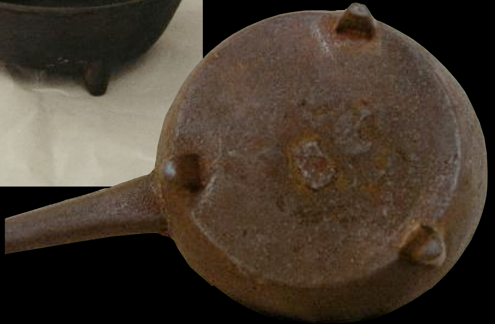
Small Cast Iron Skillet 18th Century (Private Collection)