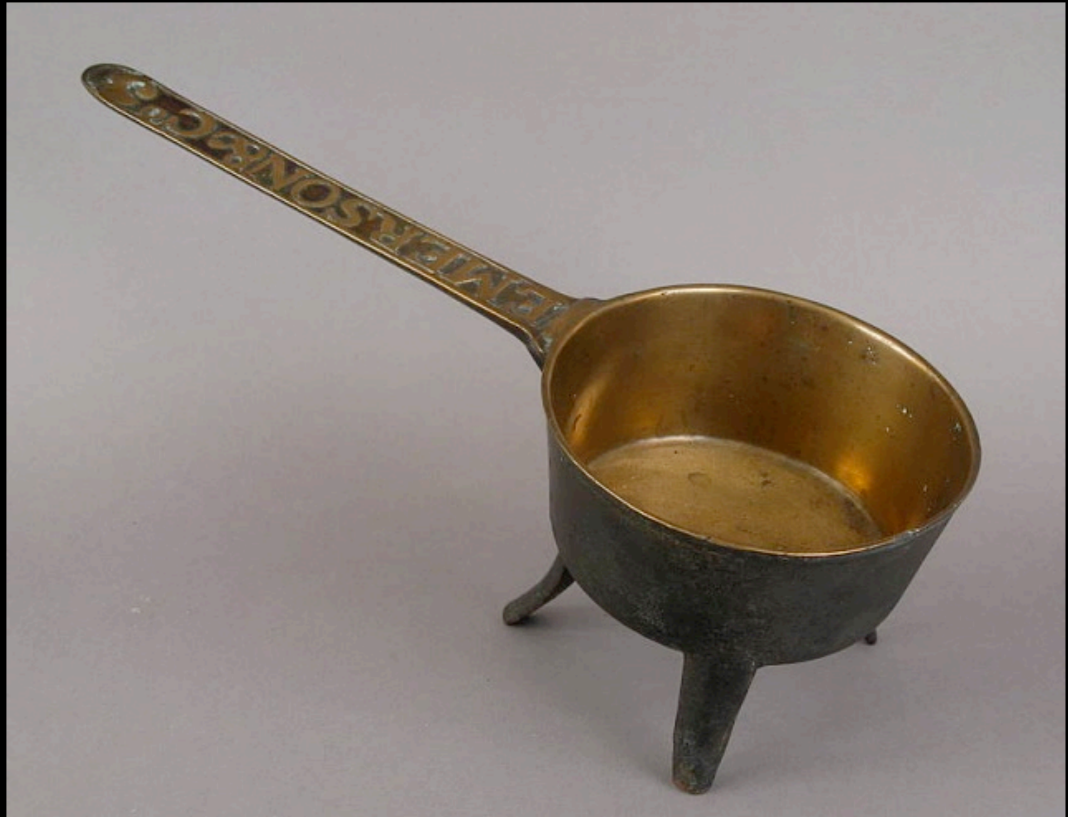
English Bronze Posnet Marked "Emerson & Co." Bristol 18th Century (Private Collection)