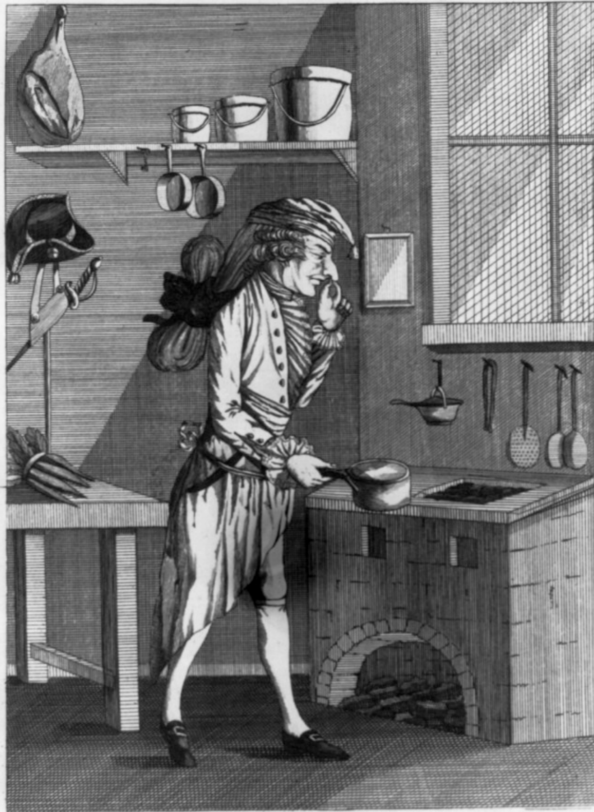
A MACARONI FRENCH COOK.