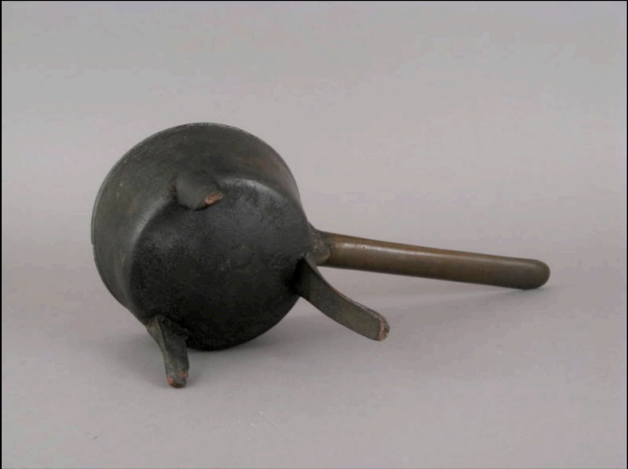
English Bronze Posnet Marked "Emerson & Co." Bristol 18th Century (Private Collection)