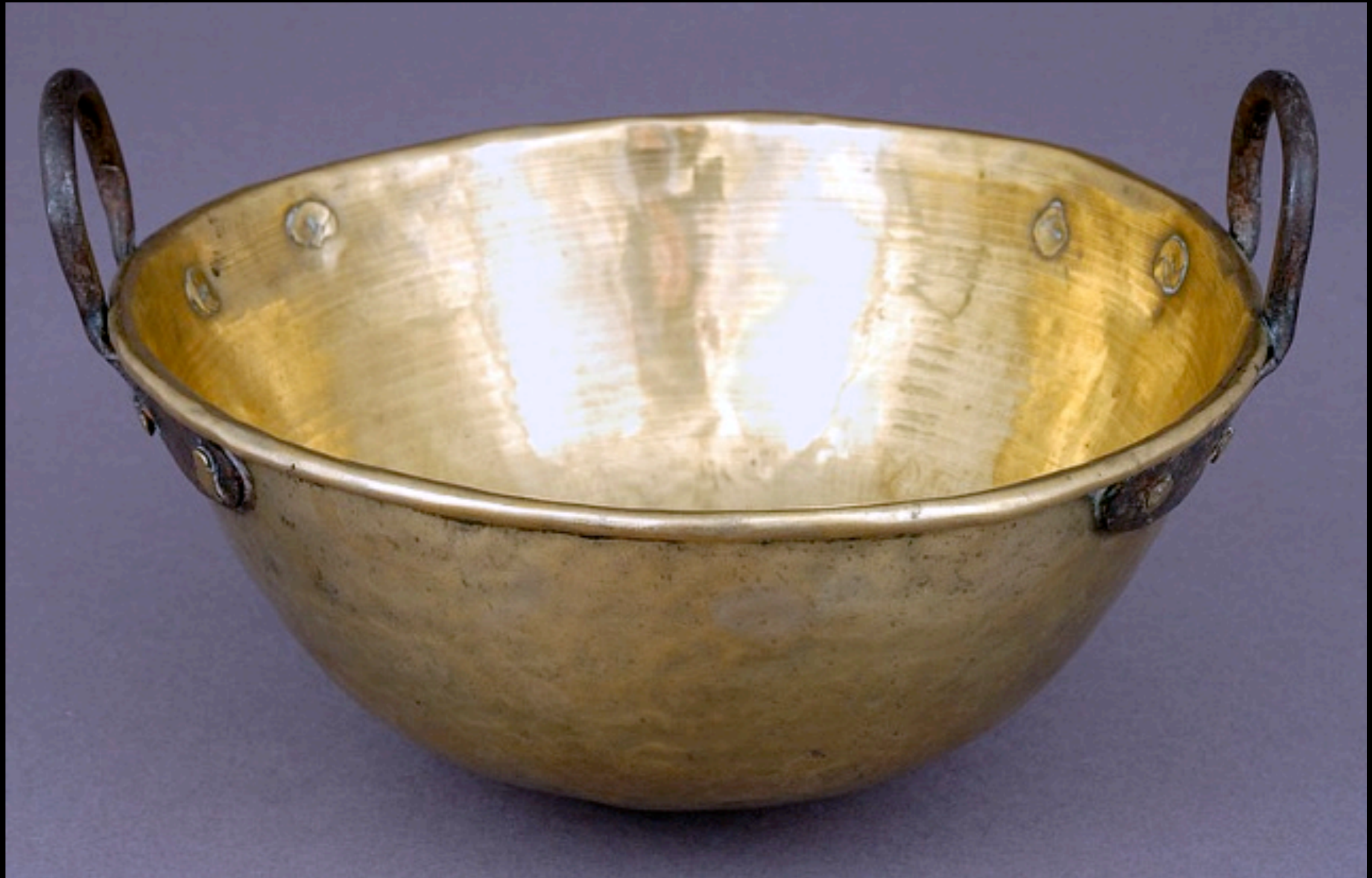
Sheet Brass Pan with Iron Handles Late 18th Century (Louwers Antiques)