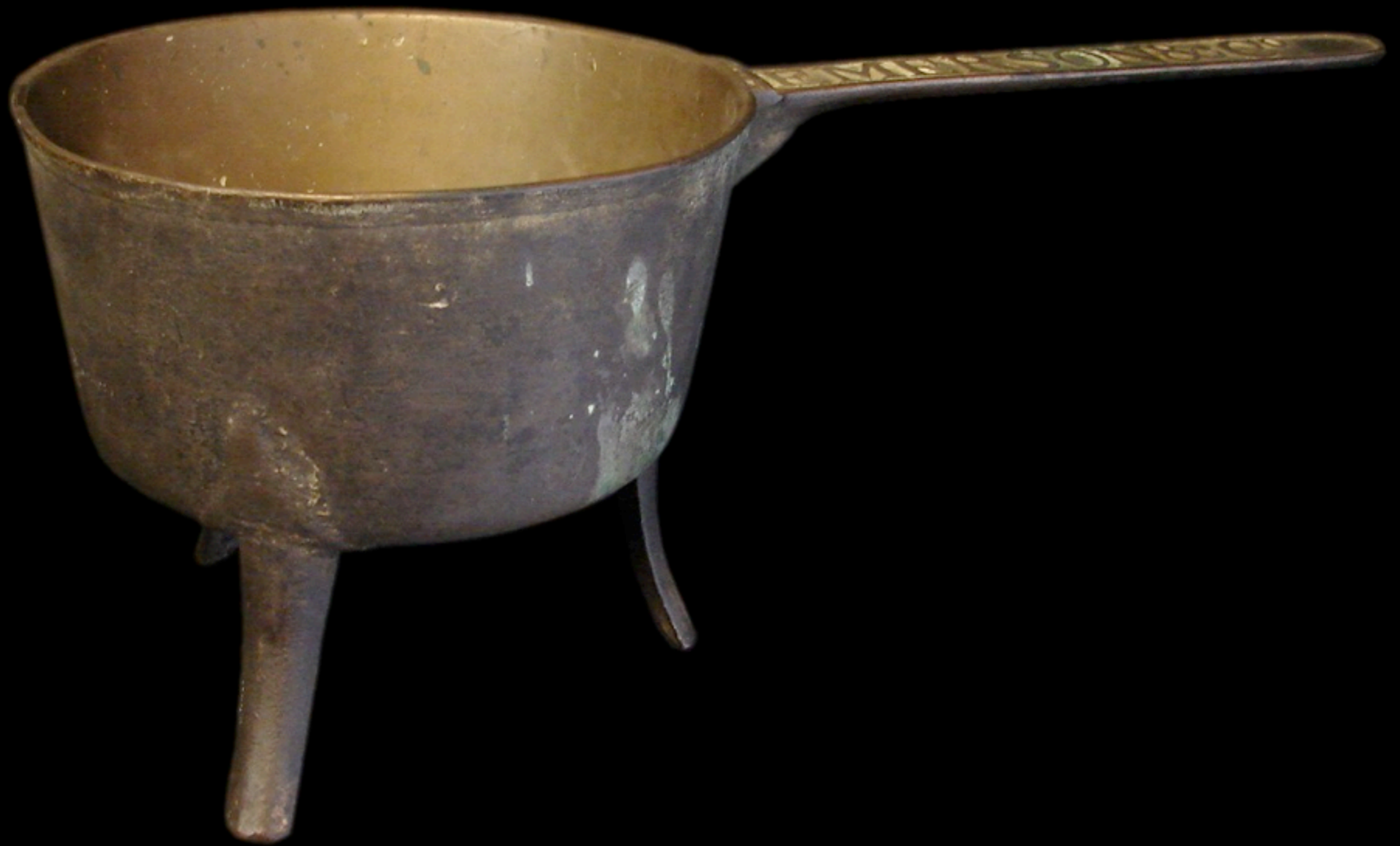
English Bronze Posnet Marked "Emerson & Co." Bristol 18th Century (Private Collection)