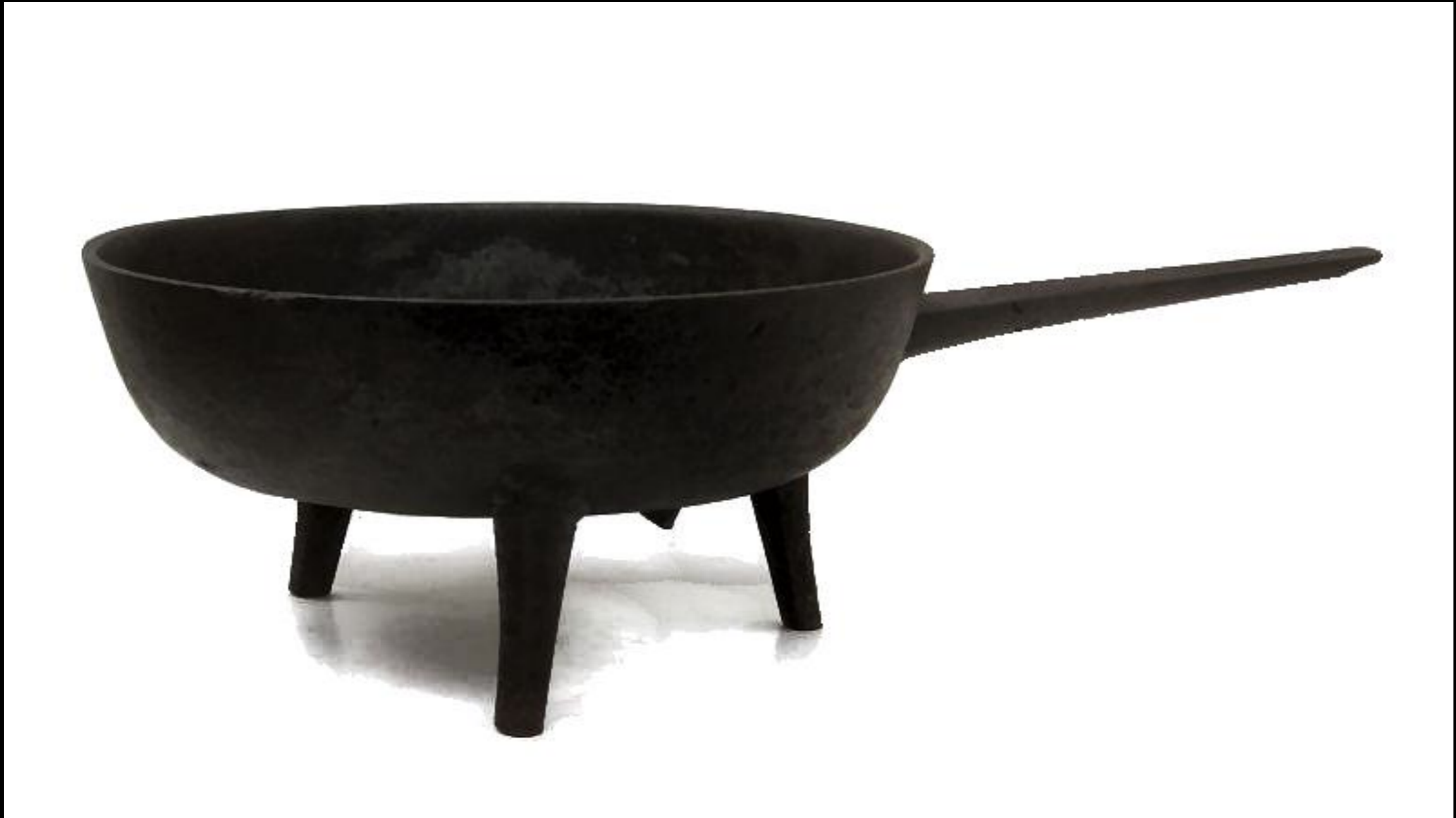
Cast Iron Skillet 18th Century (Private Collection)