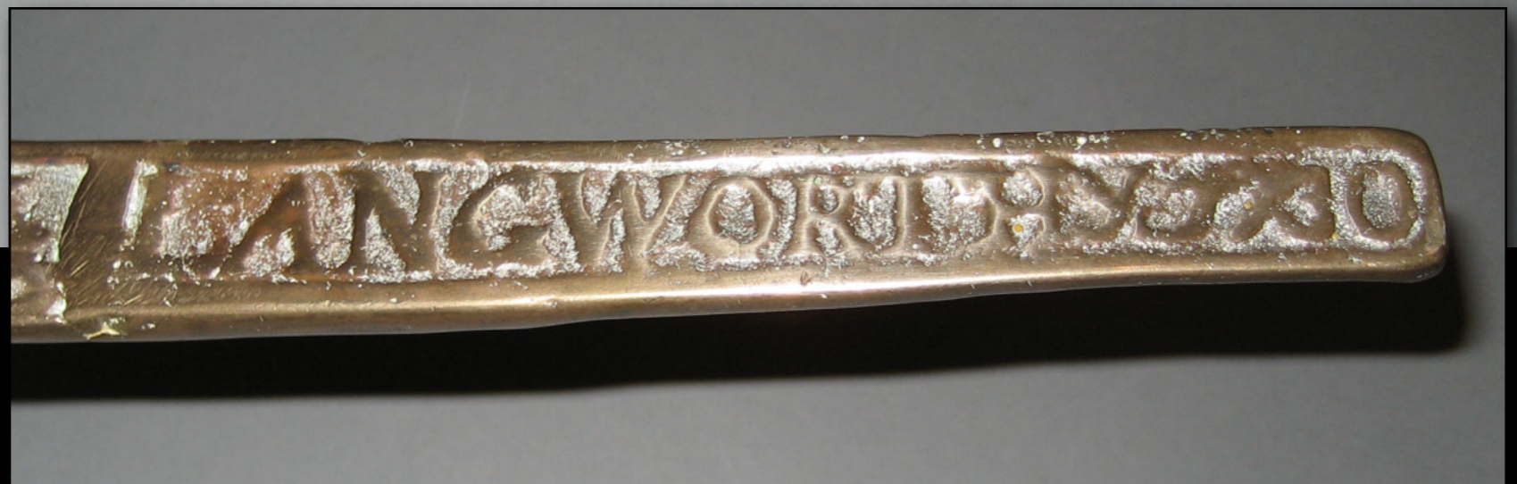
American Bell Metal Posnet by Lawrence Langworthy of Newport, Rhode Island 1730 (Winterthur)