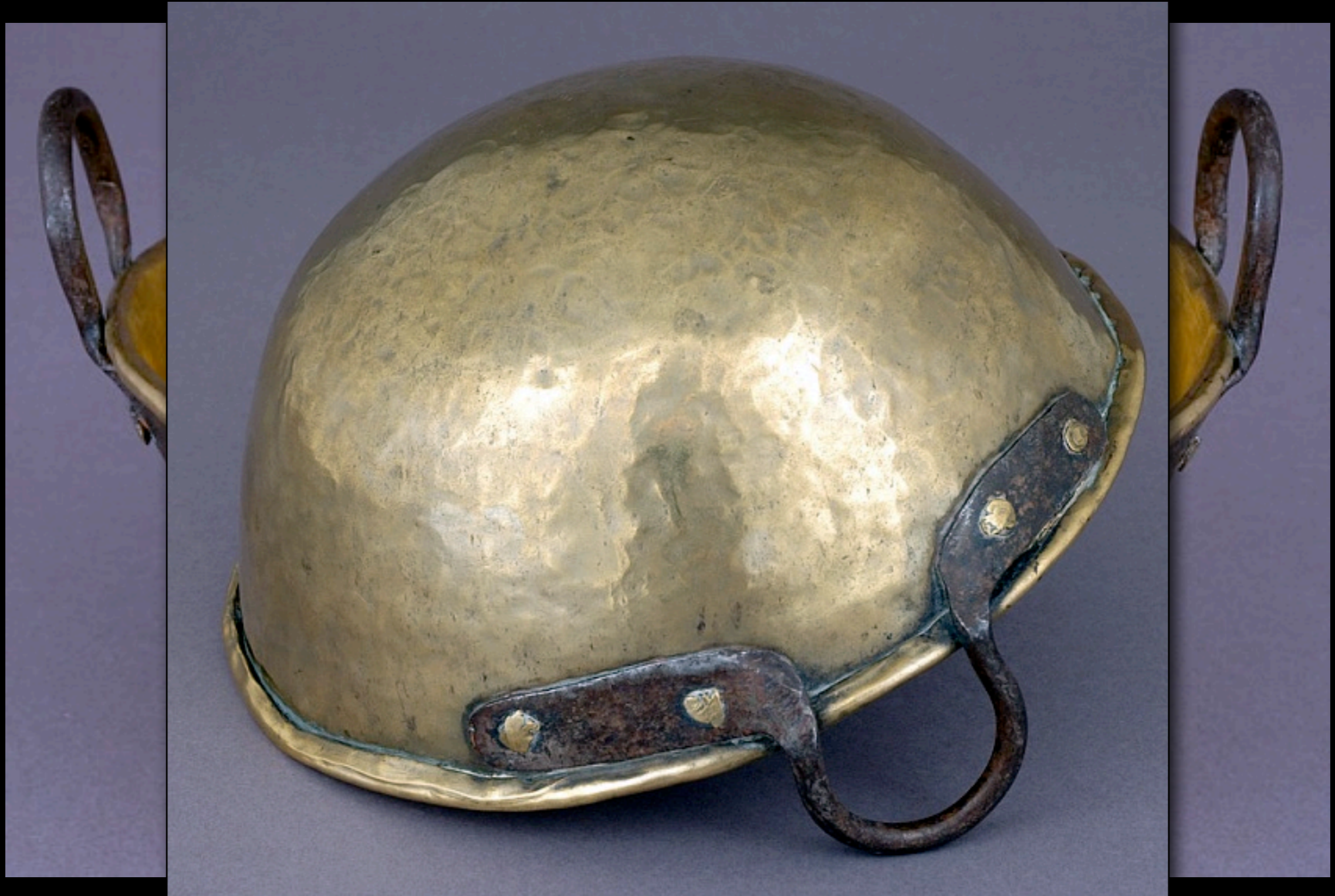
Sheet Brass Pan with Iron Handles Late 18th Century (Louwers Antiques)