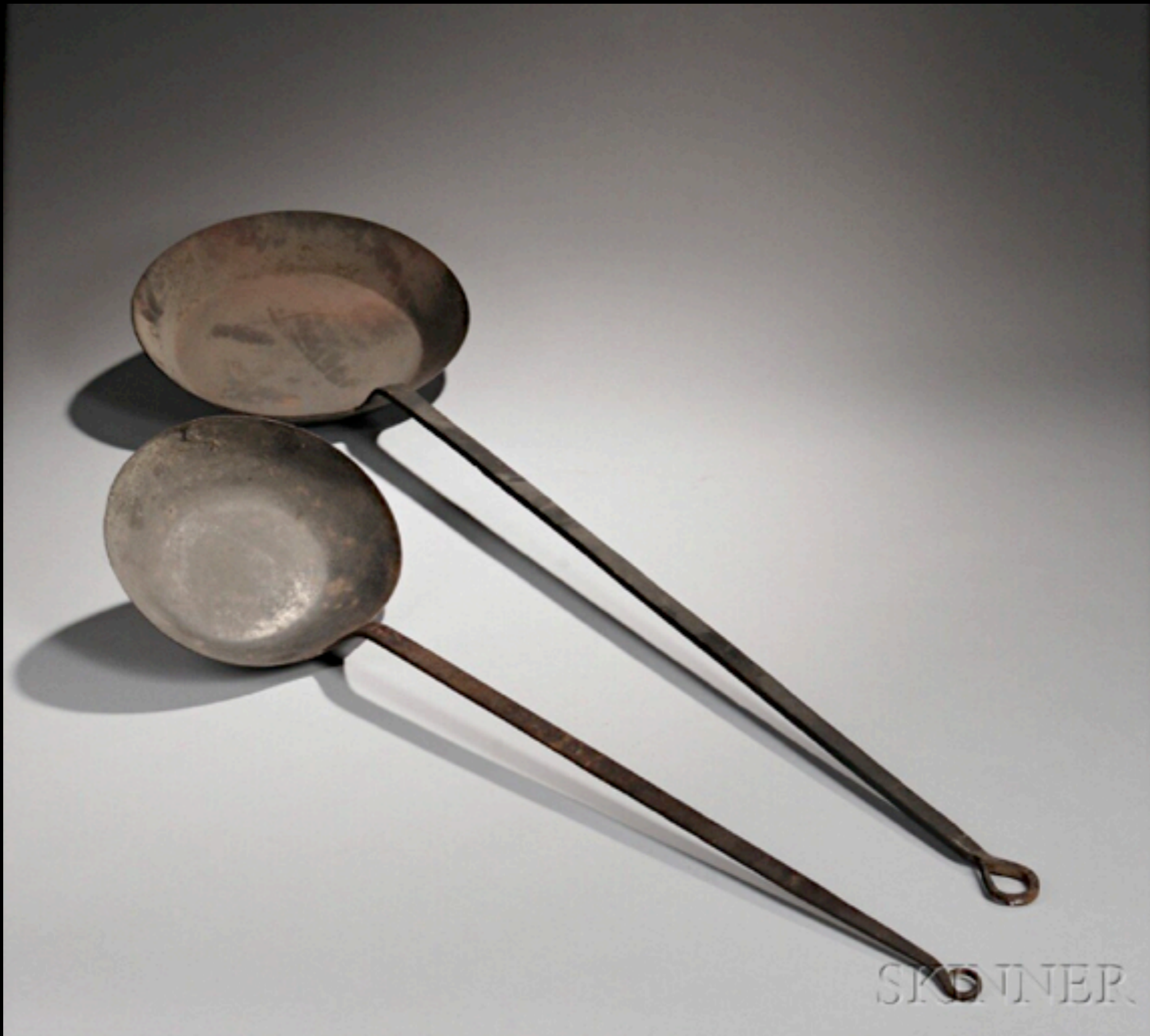
Two Wrought Iron Long Handled Skillets Late 18th - Early 19th Century (Skinner)