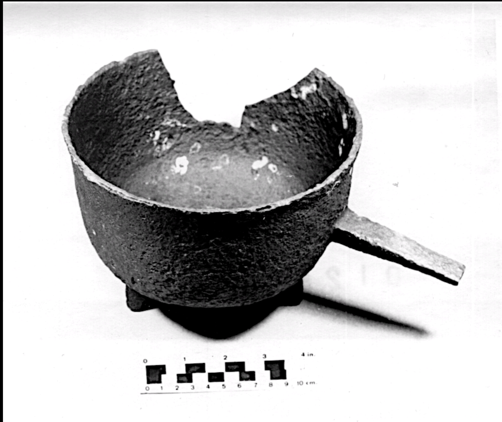
Cast Iron Posnet Recovered from the Catoctin Furnace Foundry Site (18FR320) of Frederick County, Maryland 18th Century (Archeological Collection of Maryland)