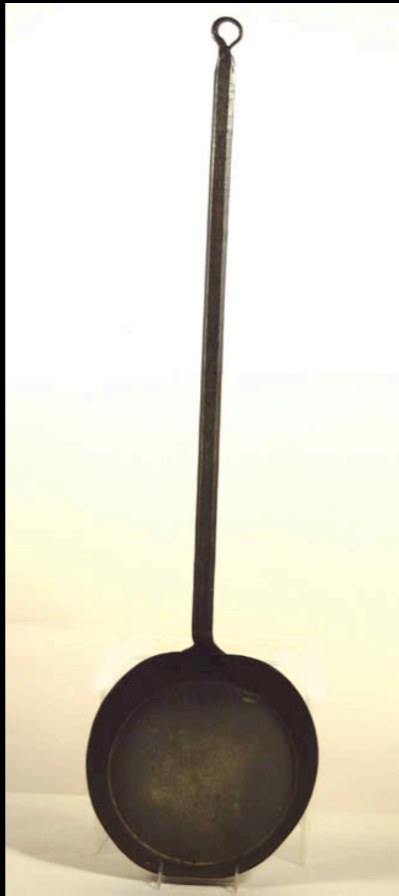
Long Handled Sheet Iron Skillet 18th Century