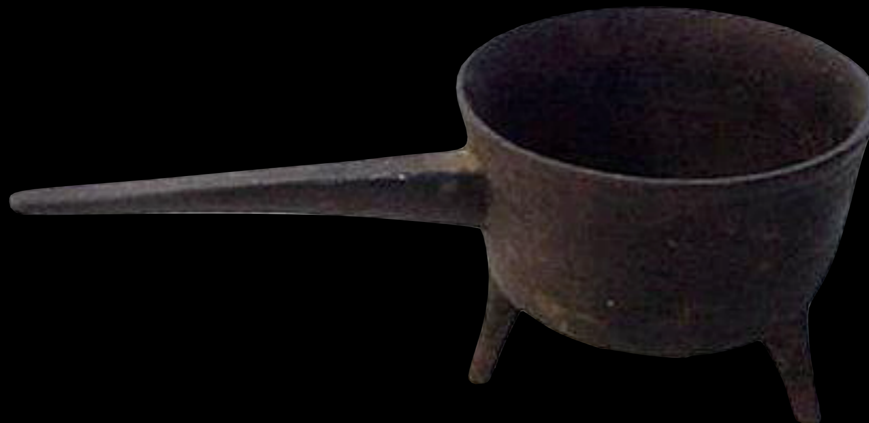
Cast Iron Posnet with a Linear Gate Mark 18th Century (Private Collection)