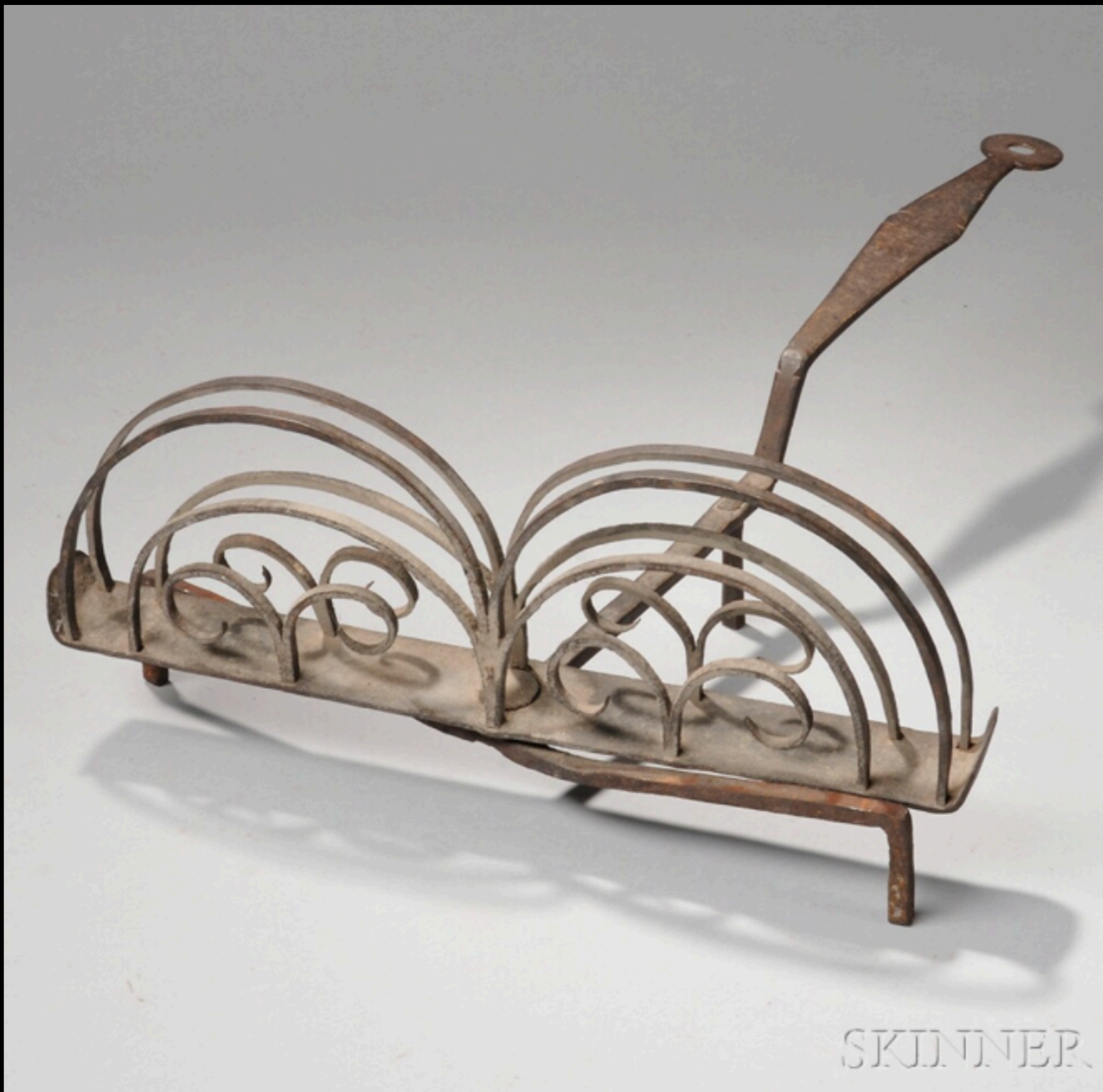
American Wrought Iron Rotary Toaster Late 18th - Early 19th Century (Skinner - The Howard Roth Collection)