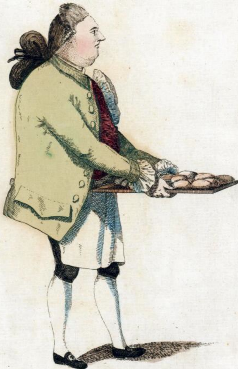
THE BUN MACARONI. Publ d accord d to act Oct. 9 1772. by Dimsy, 39 Strand.