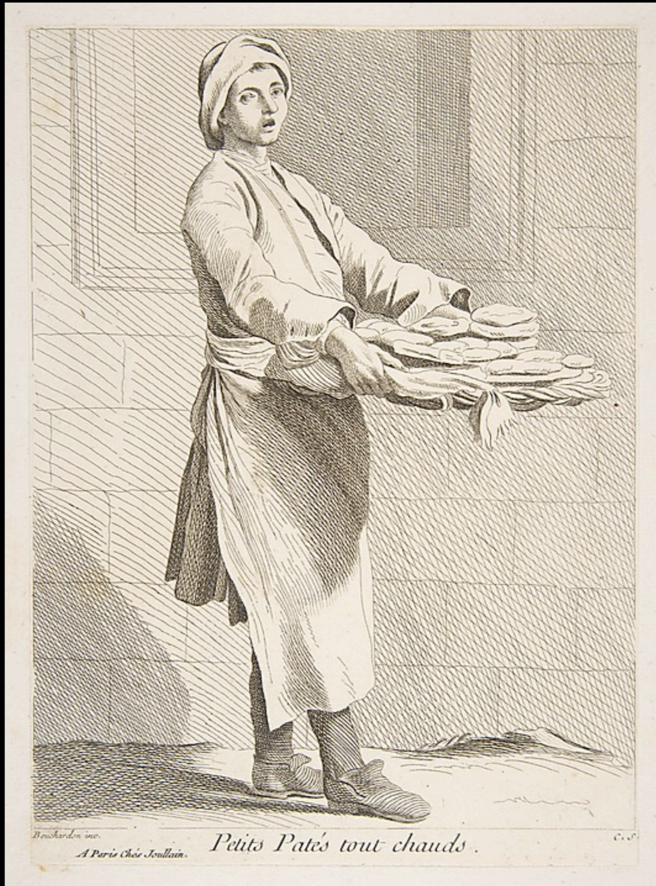
Pastry Seller by Anne Claude Philippe de Tubières, Comte de Caylus after Edme Bouchardon 1738 (Metropolitan Museum of Art)