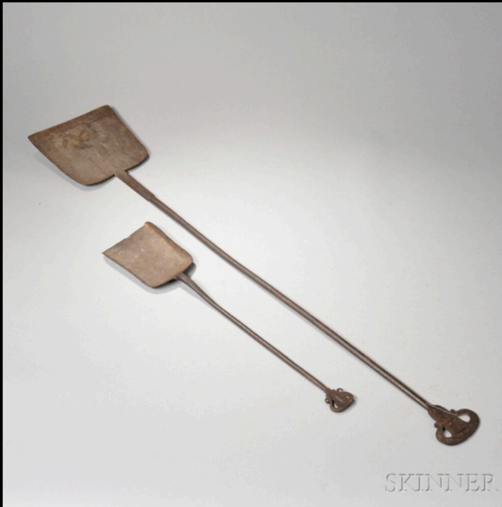
Two American Wrought Iron Peels Late 18th - Early 19th Century