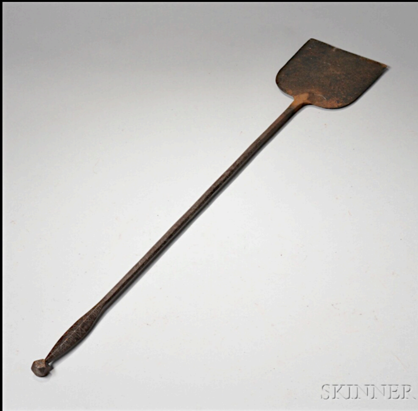
American Wrought Iron Peel Late 18th - Early 19th Century (Skinner - The Howard Roth Collection)