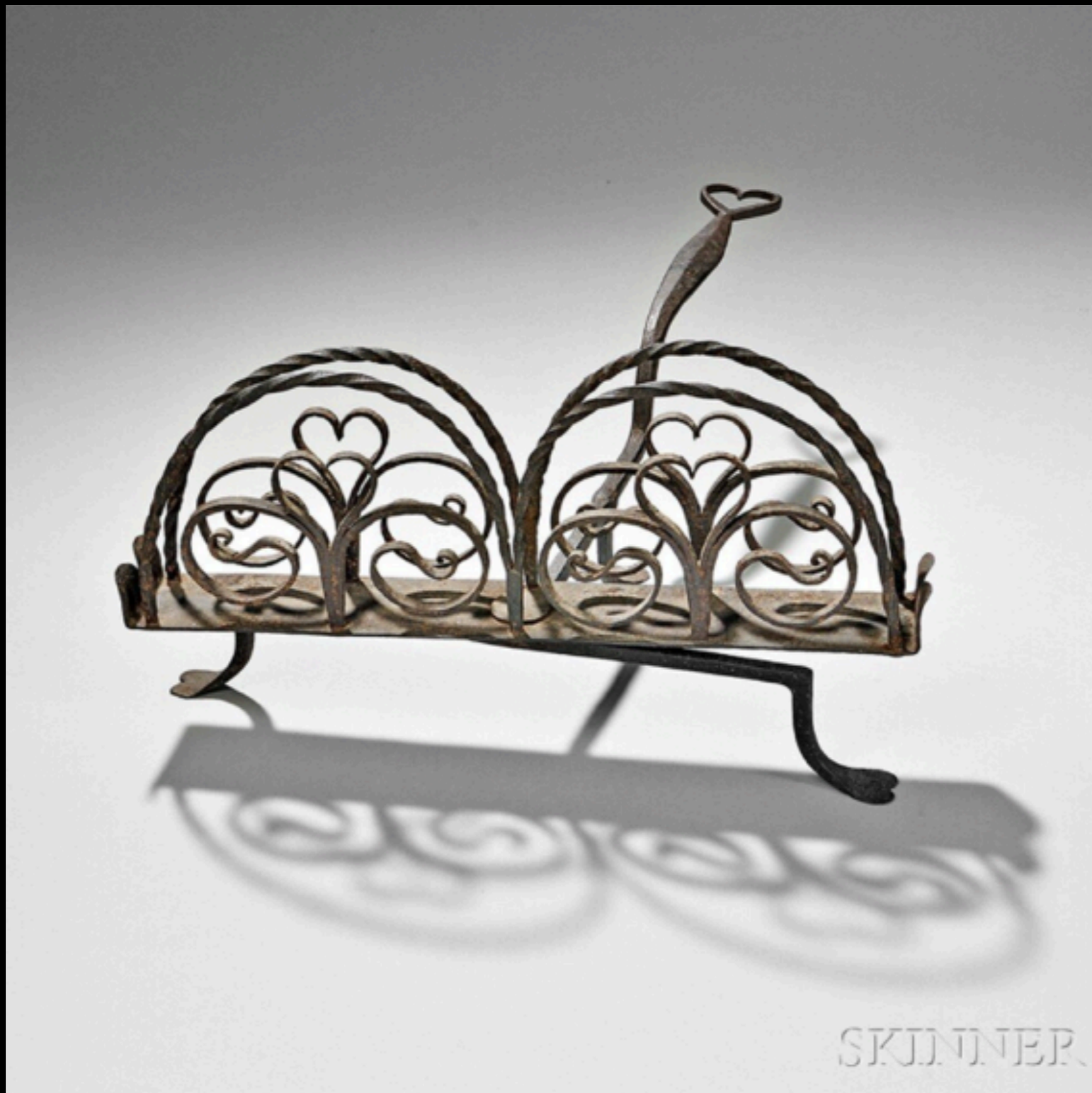
American Wrought Iron Rotary Toaster Late 18th - Early 19th Century