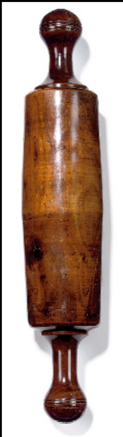
English Fruitwood Rolling Pin