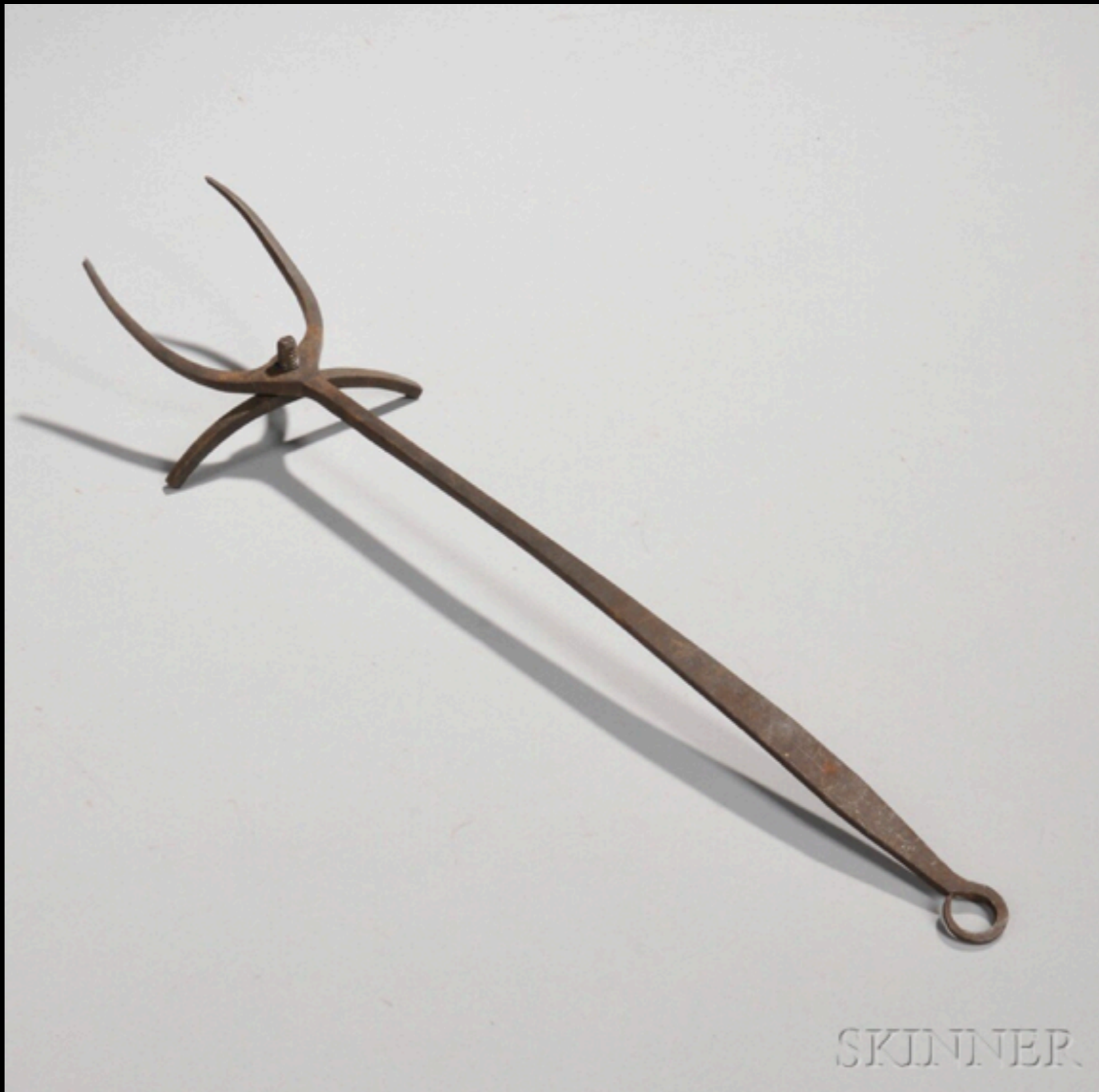
American Wrought Iron Toasting Fork Late 18th - Early 19th Century (Skinner - The Howard Roth Collection)