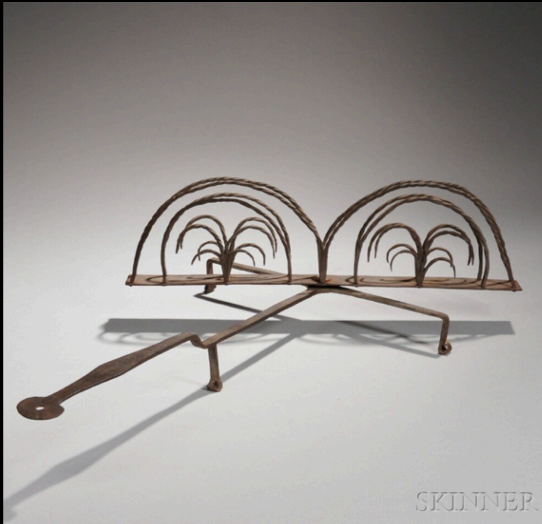
American Wrought Iron Rotary Toaster Late 18th - Early 19th Century