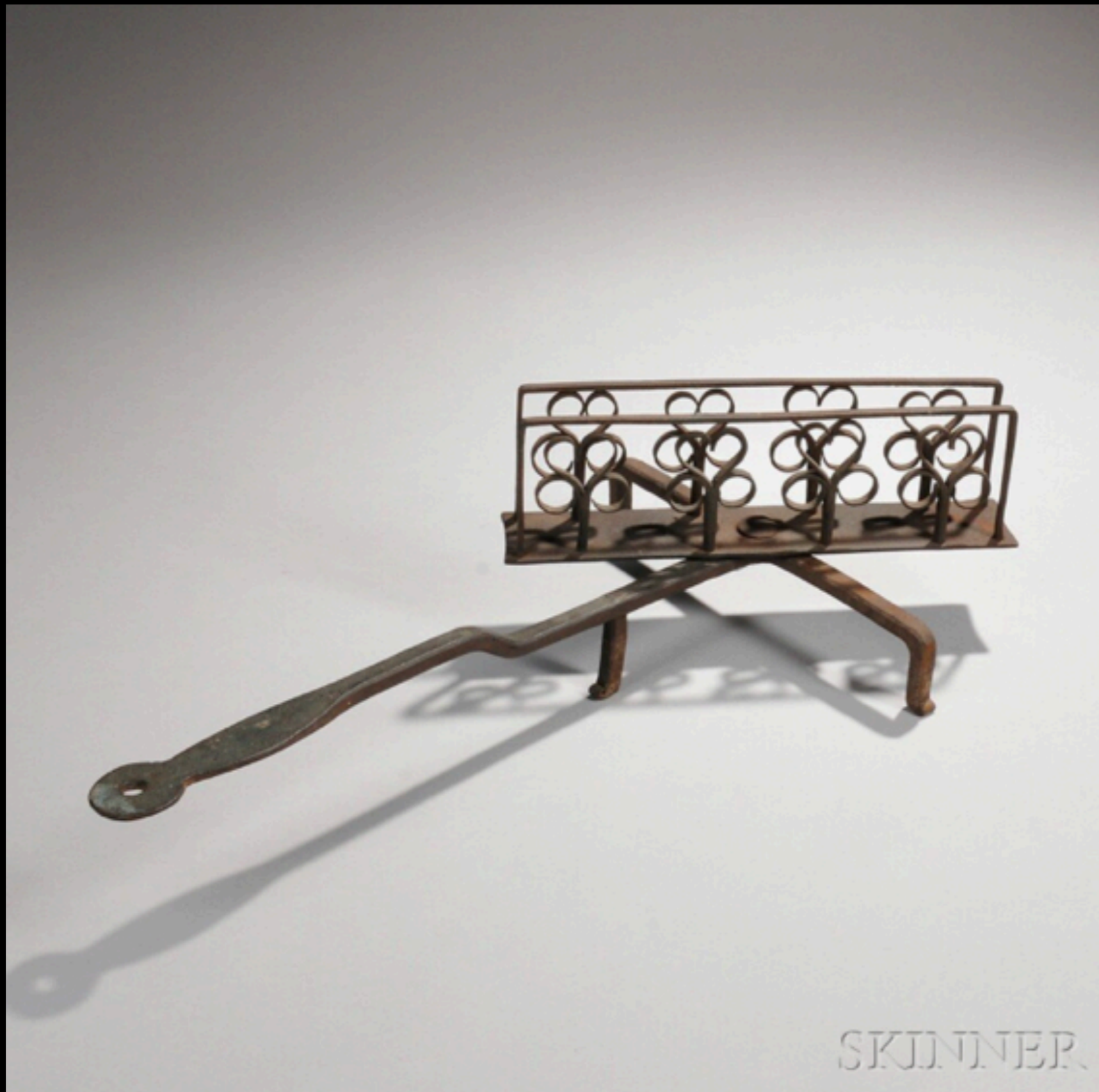
American Wrought Iron Rotary Toaster Late 18th - Early 19th Century (Skinner - The Howard Roth Collection)