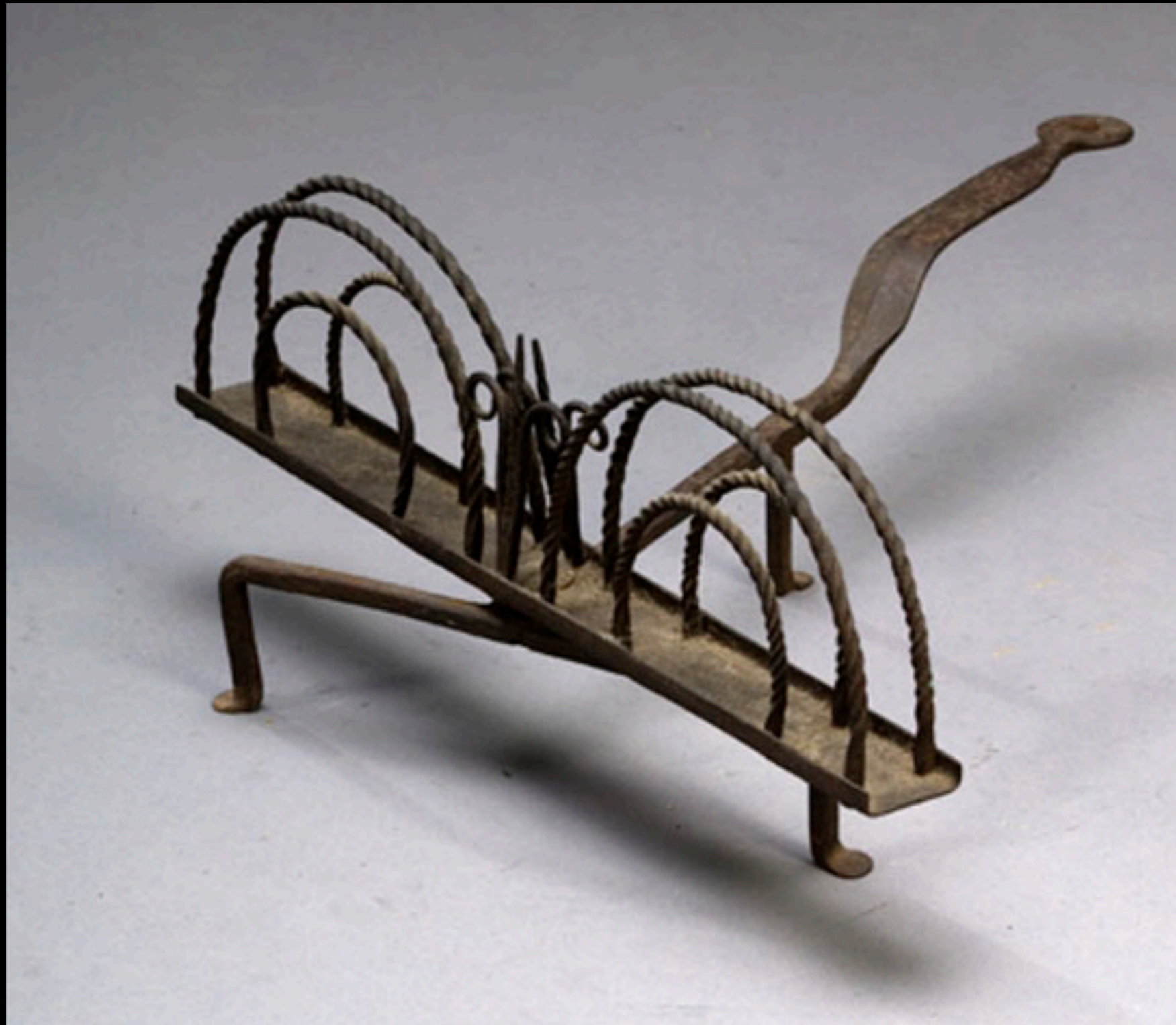
Wrought Iron Rotating Toast Rack 18th Century (Cowan's Auction House)