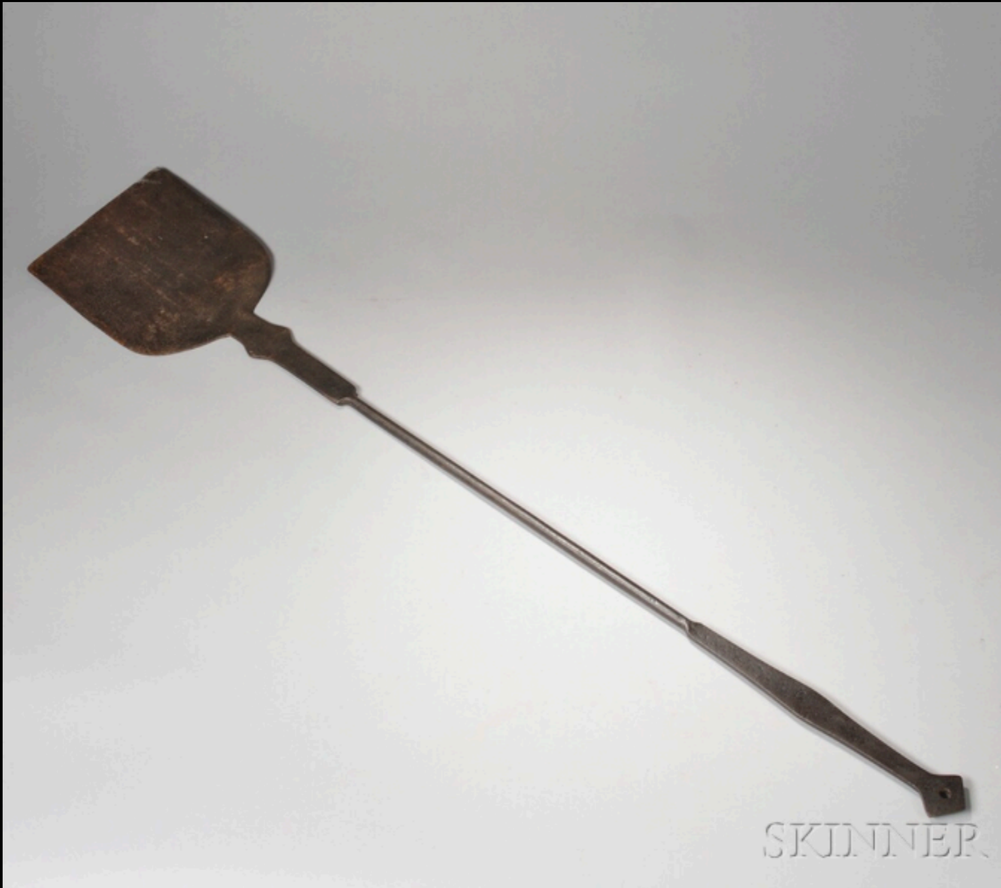
American Wrought Iron Peel Late 18th - Early 19th Century (Skinner - The Howard Roth Collection)