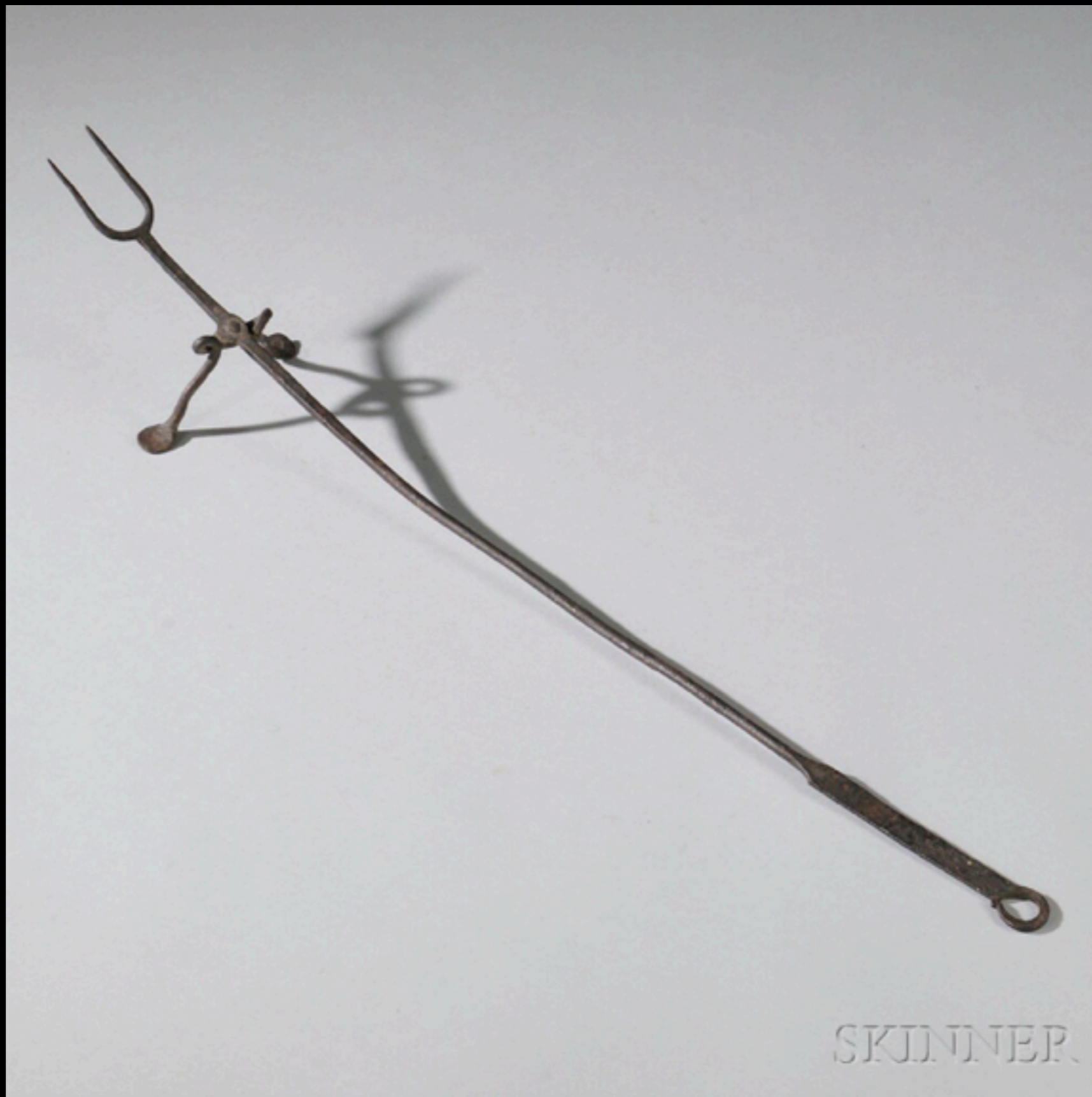
American Wrought Iron Toasting Fork Late 18th - Early 19th Century (Skinner - The Howard Roth Collection)