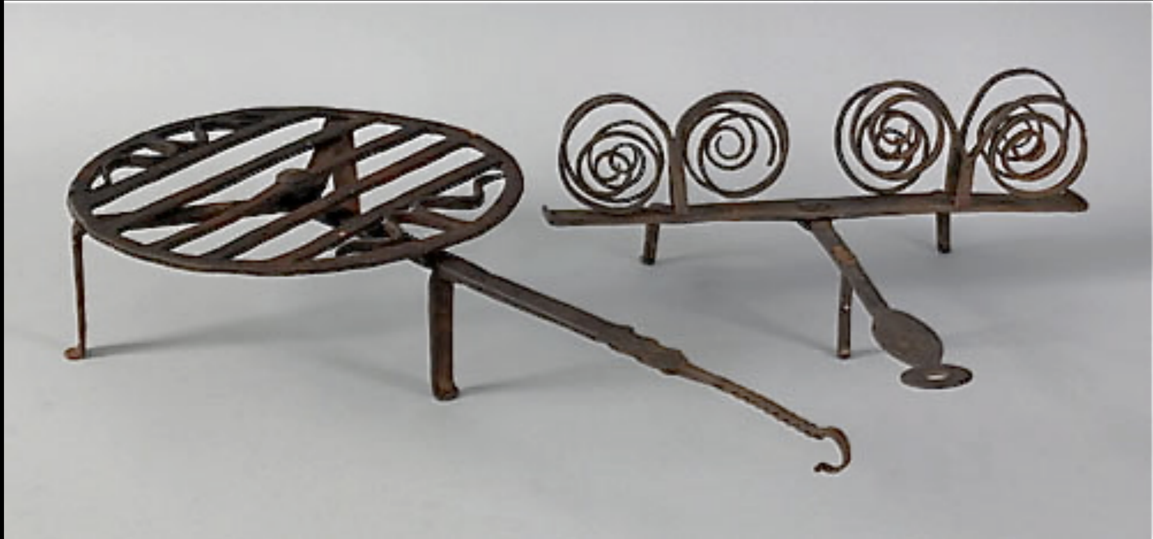
Iron Swivel Griddle and Toaster 18th Century