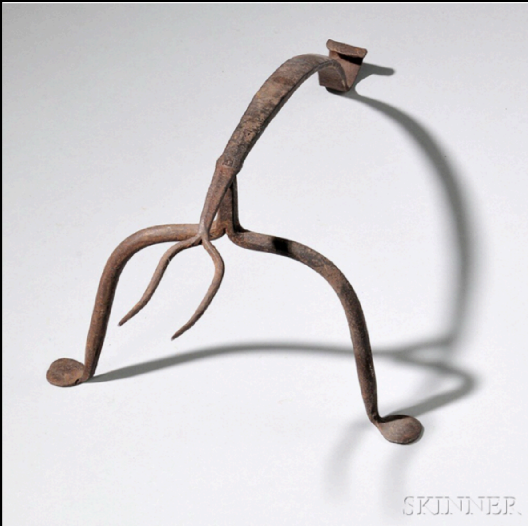
American Wrought Iron Toasting Fork Late 18th - Early 19th Century (Skinner - The Howard Roth Collection)