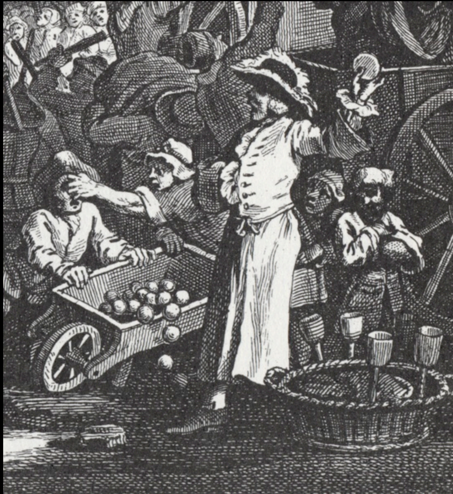
Tiddy Doll, itinerant gingerbread seller – detail from William Hogarth's Industry and Idleness Plate II: 'The Idle Prentice Executed at Tyburn' (Yale Center for British Art)