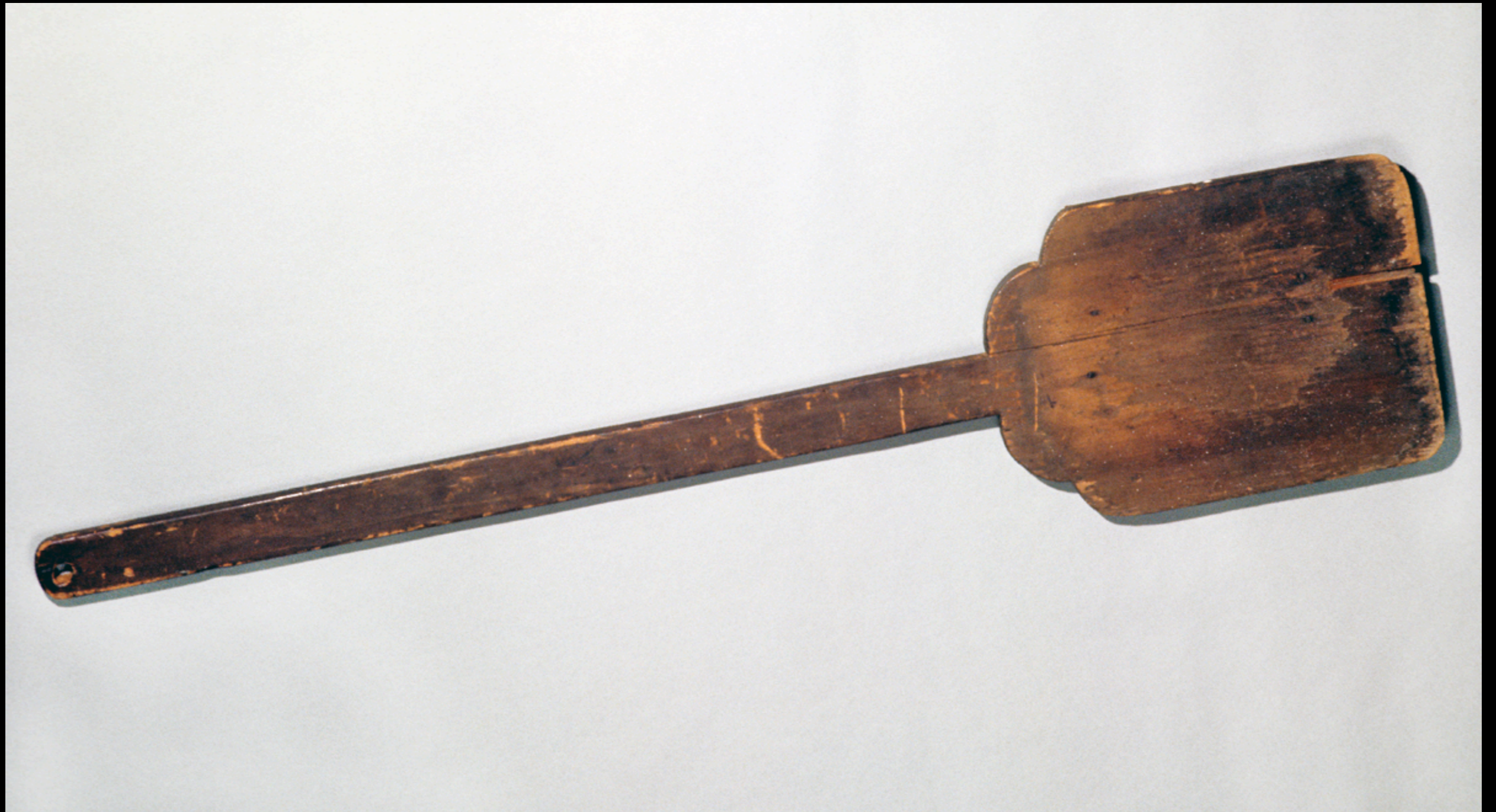
Wood Peel c. 1750 - 1800 (Winterthur)