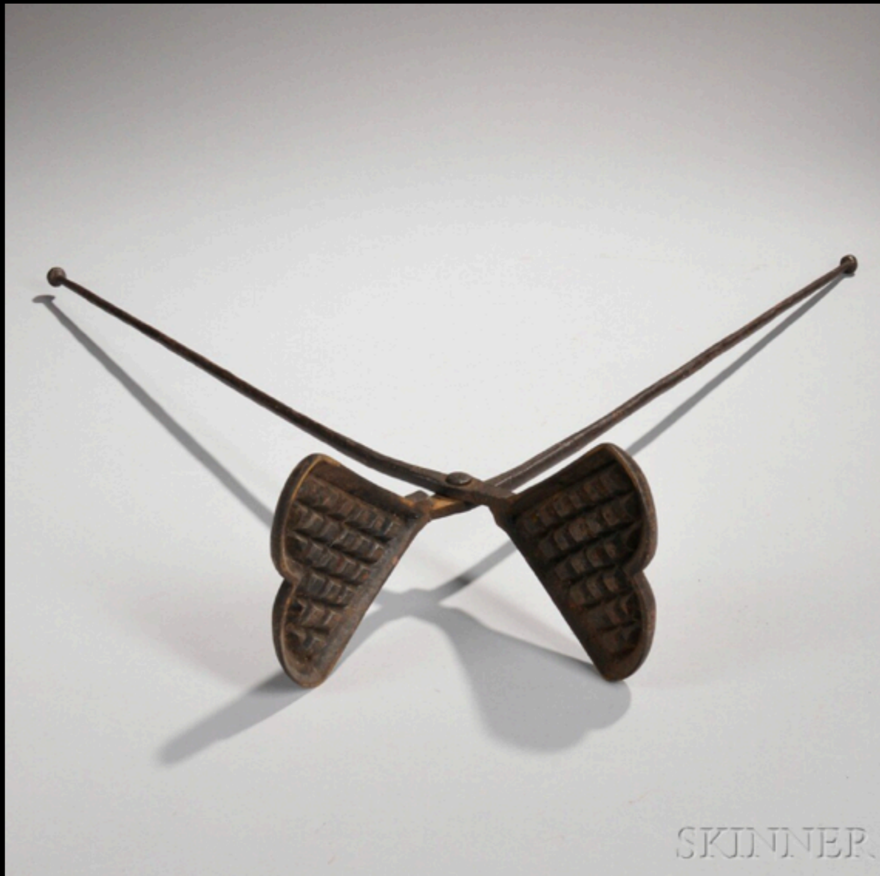
American Cast & Wrought Iron Waffle Iron Marked "PGB" Late 18th - Early 19th Century (Skinner - The Howard Roth Collection)