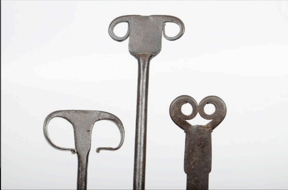
Peels Late 18th - Early 19th Century (Cowan's Auction House)