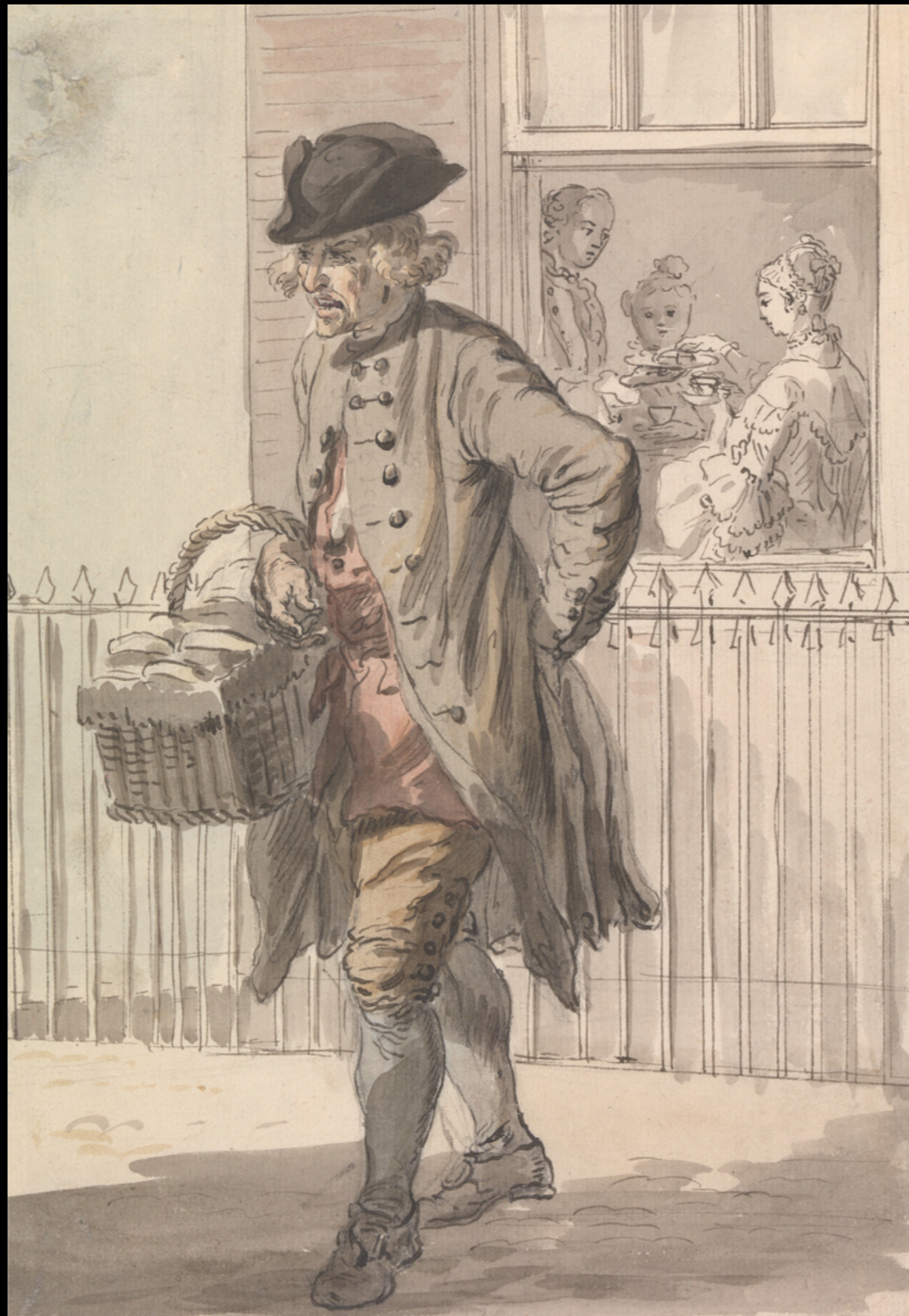
London Cries: "A Muffin Man"