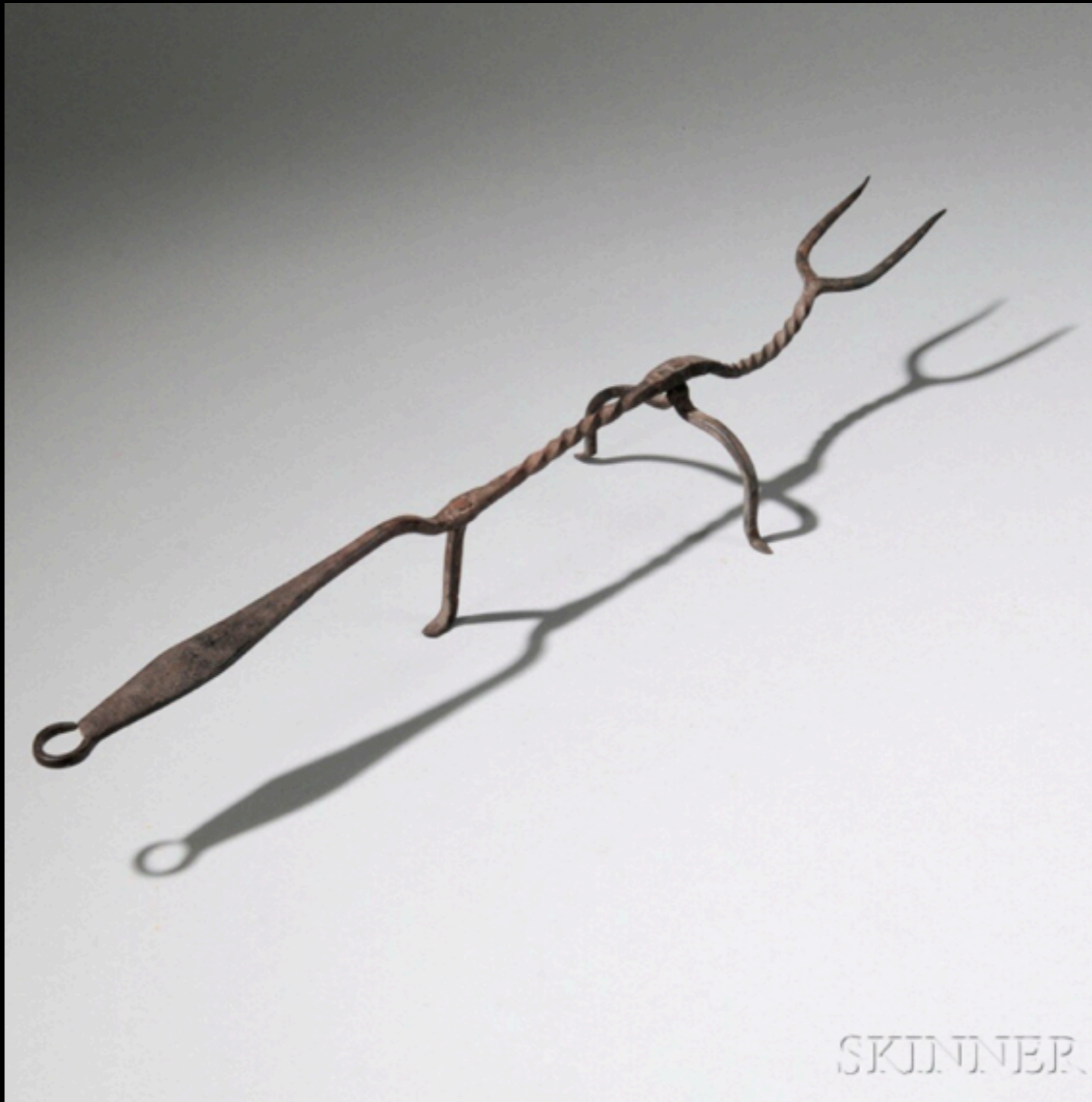
American Wrought Iron Toasting Fork Late 18th - Early 19th Century (Skinner - The Howard Roth Collection)