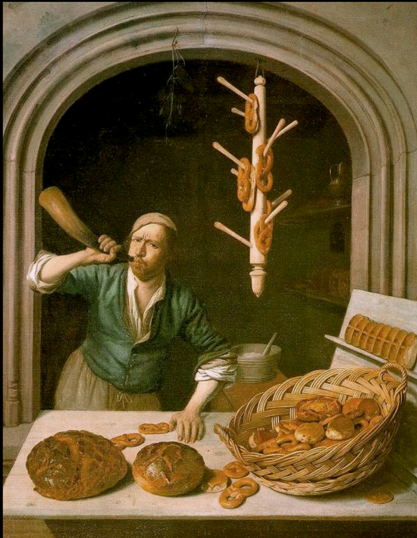
A Baker Selling His Goods by Job Adriaenszoon Berckheyde (27 January 1630 – 10 June 1698)