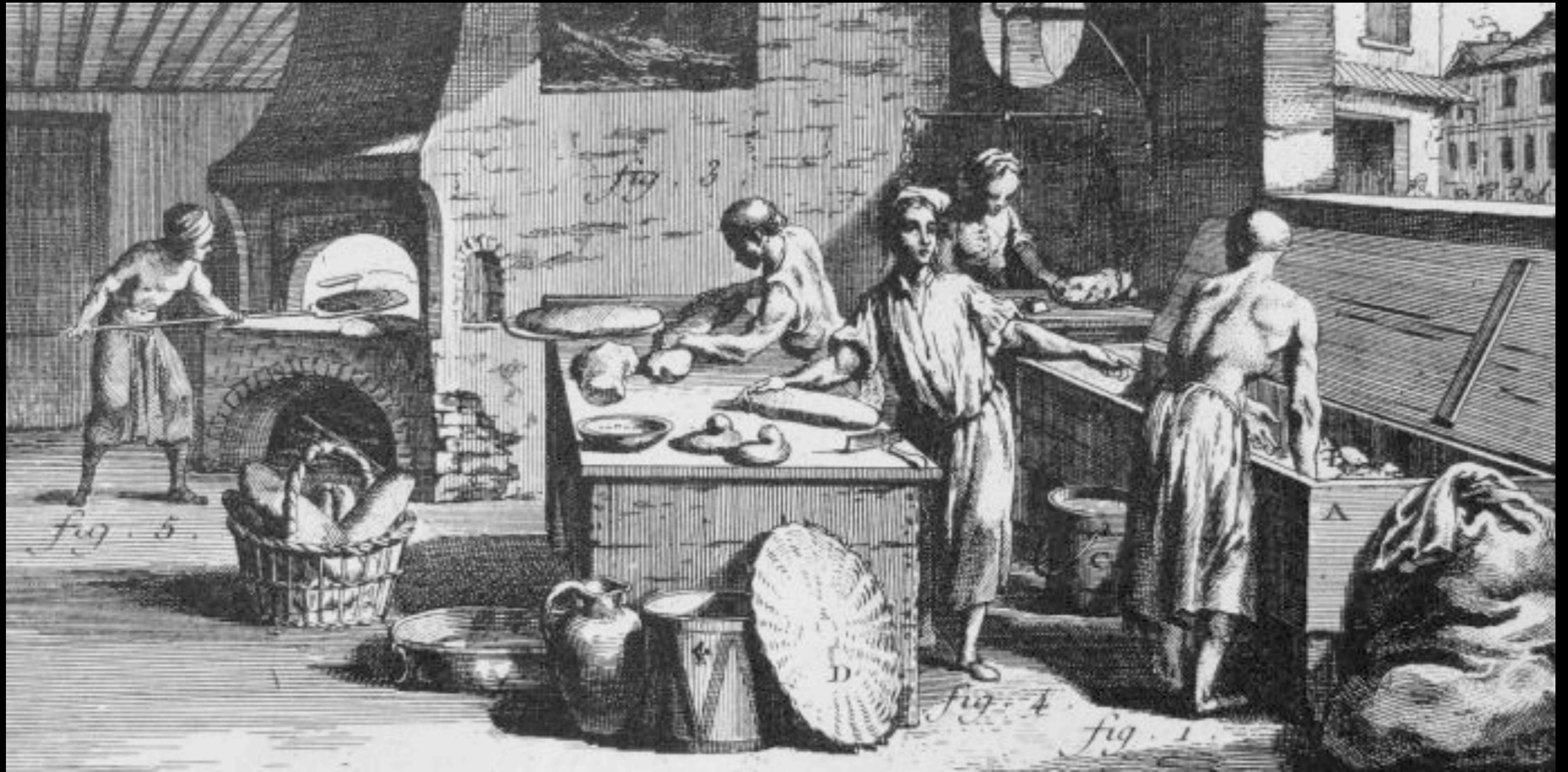
Diderot's Encyclopædia 1763