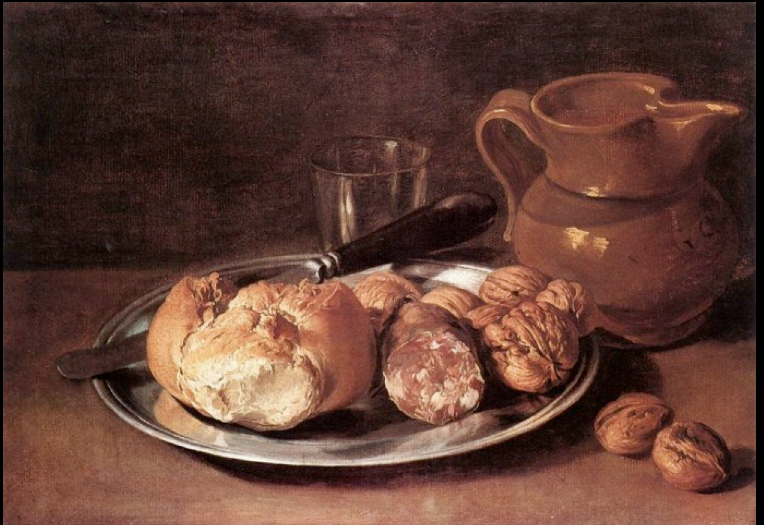
Still Life with Bread by Giacomo Ceruti c. 1750