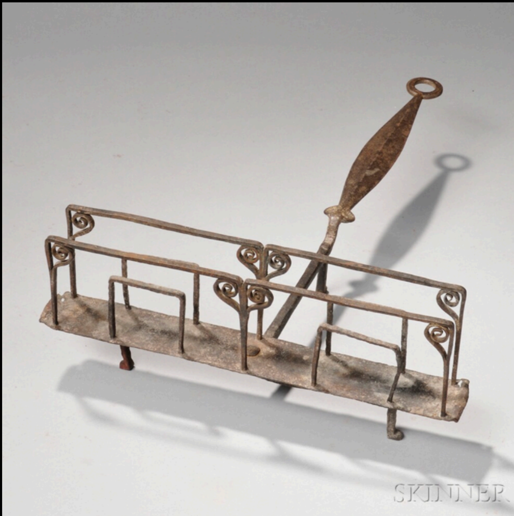
American Wrought Iron Rotary Toaster Late 18th - Early 19th Century