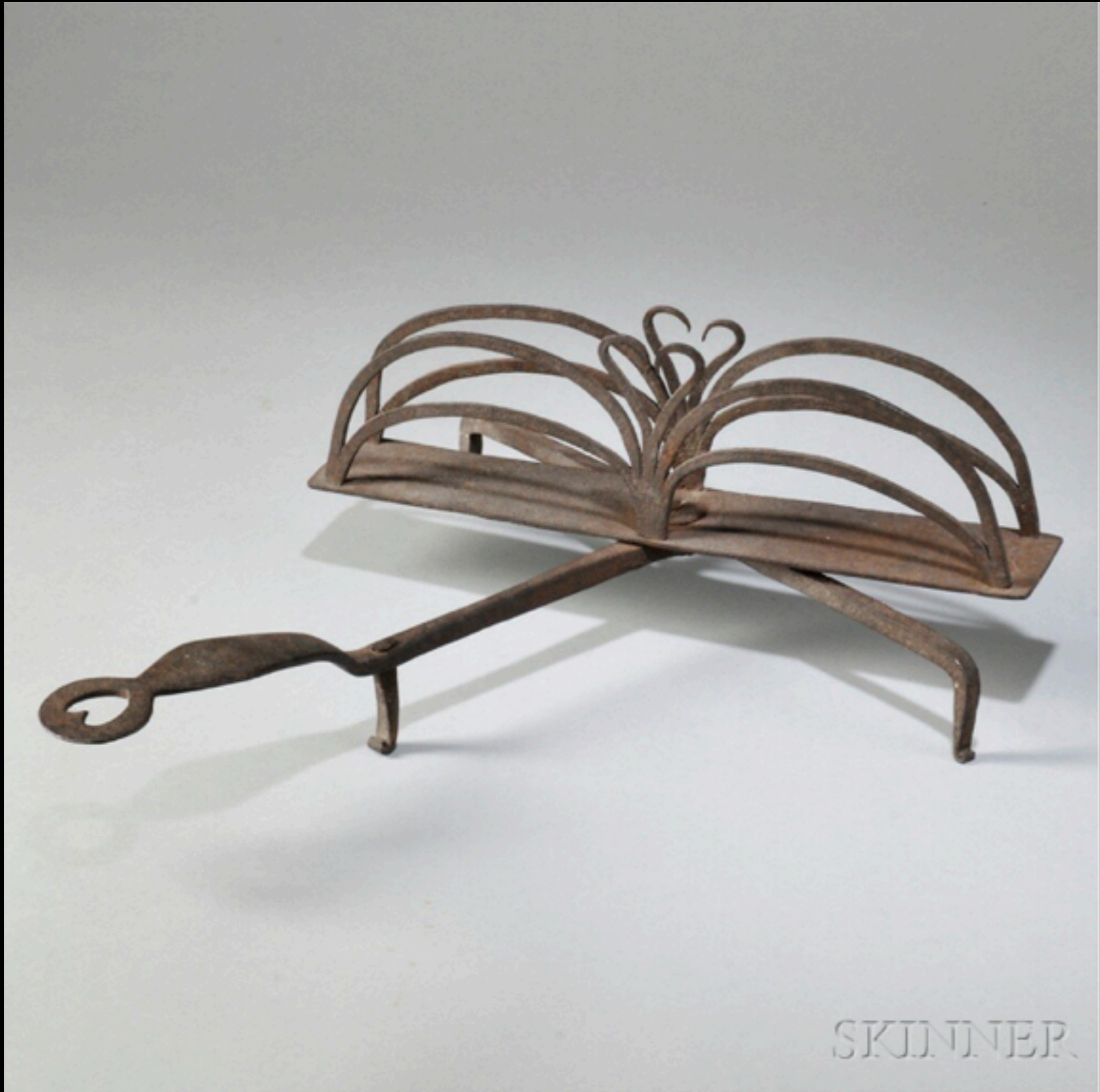
American Wrought Iron Rotary Toaster Late 18th - Early 19th Century (Skinner - The Howard Roth Collection)