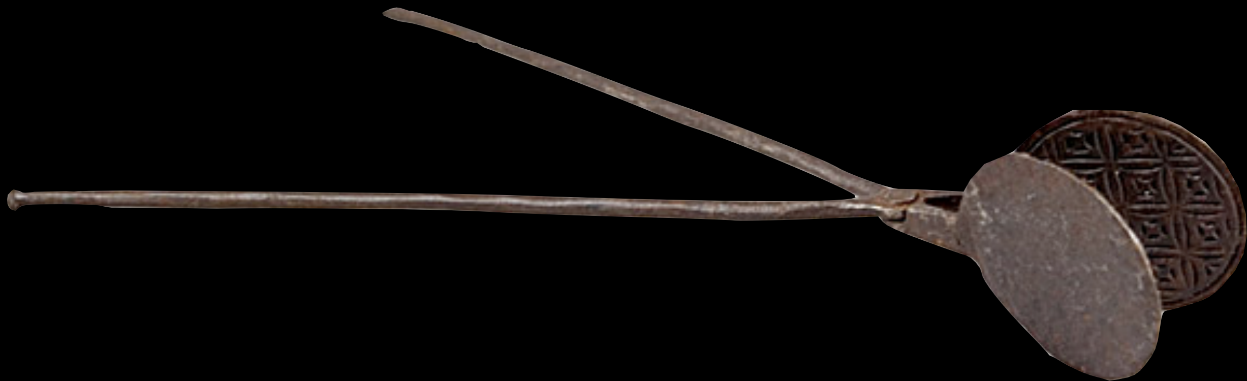
Wafer Iron 18th Century (Private Collection)