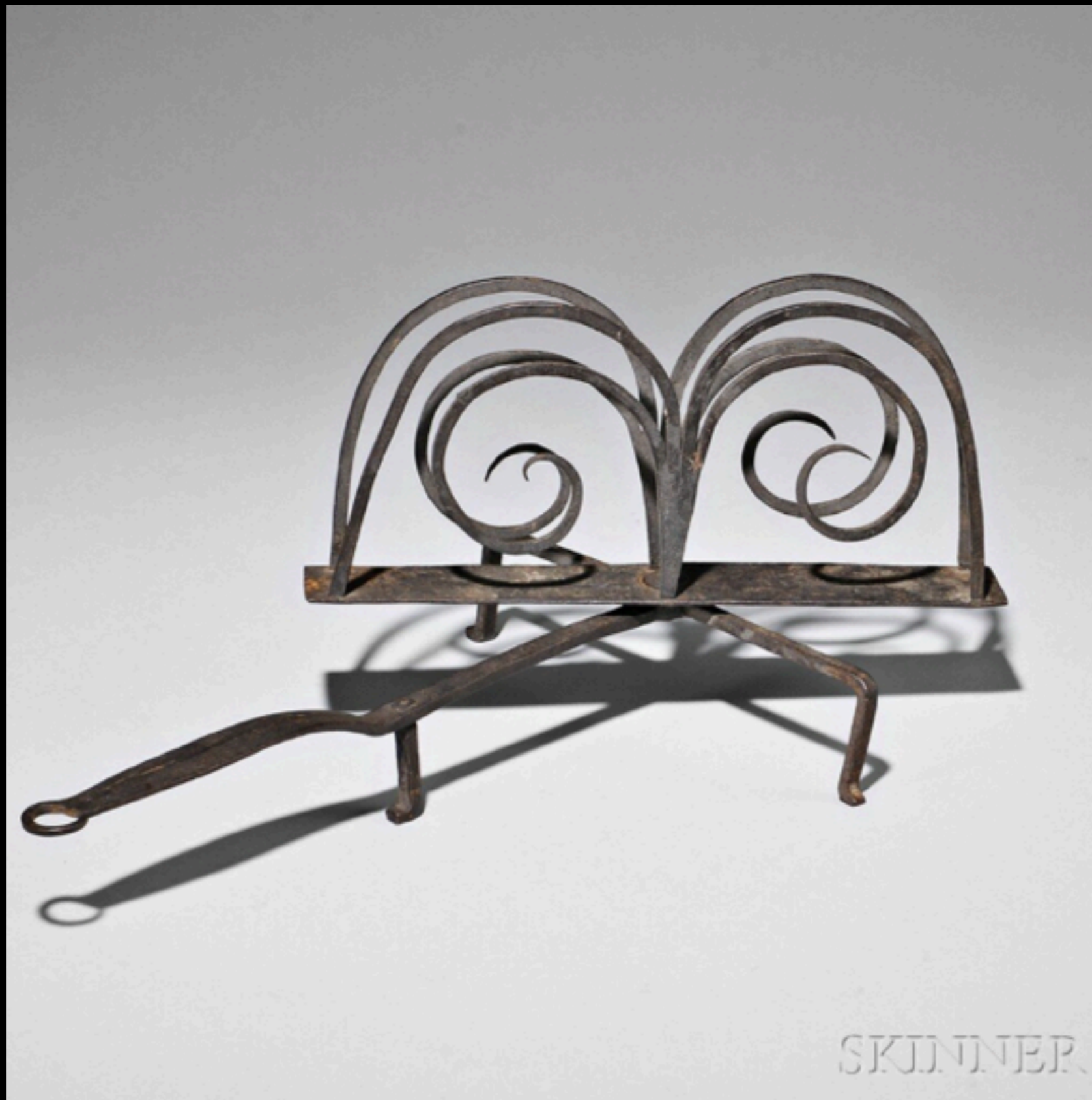
American Wrought Iron Rotary Toaster Late 18th - Early 19th Century (Skinner - The Howard Roth Collection)