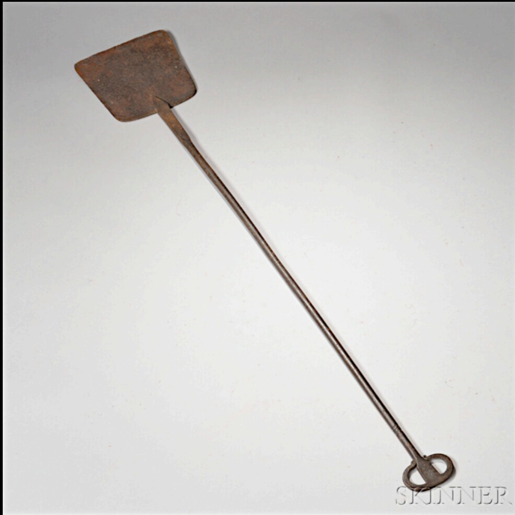
American Wrought Iron Peel Late 18th - Early 19th Century (Skinner - The Howard Roth Collection)