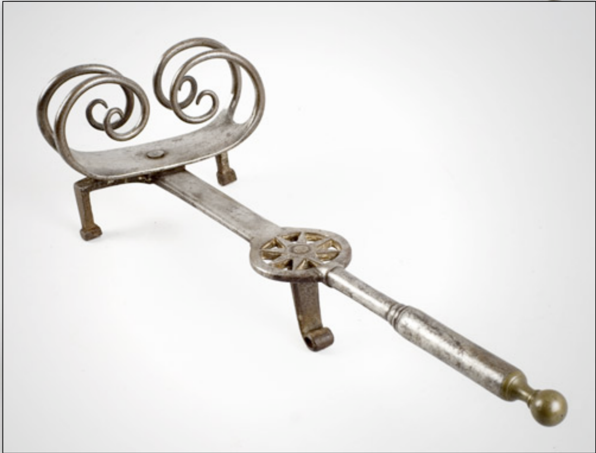
Iron and Brass Swivel Toaster 18th Century (Private Collection)