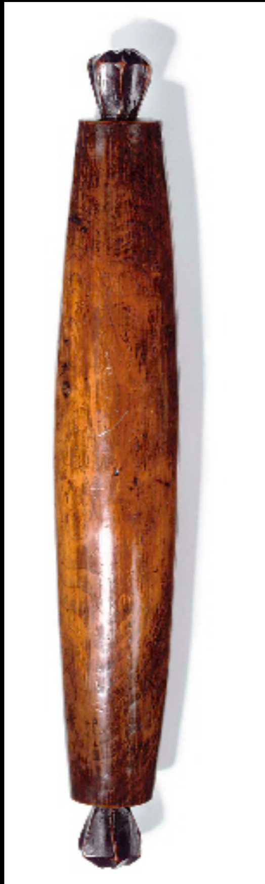
English Fruitwood Rolling Pin