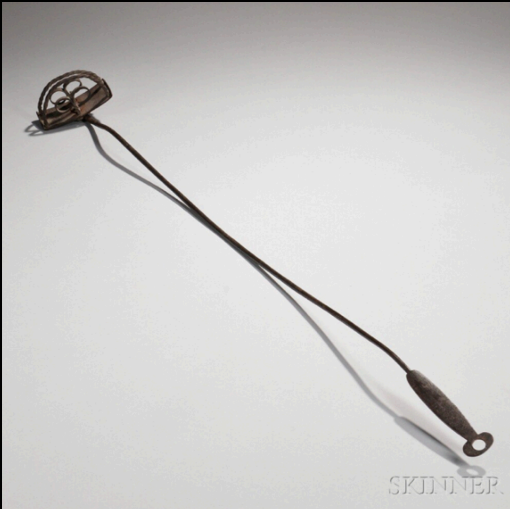
American Wrought Iron Toaster Late 18th - Early 19th Century (Skinner - The Howard Roth Collection)