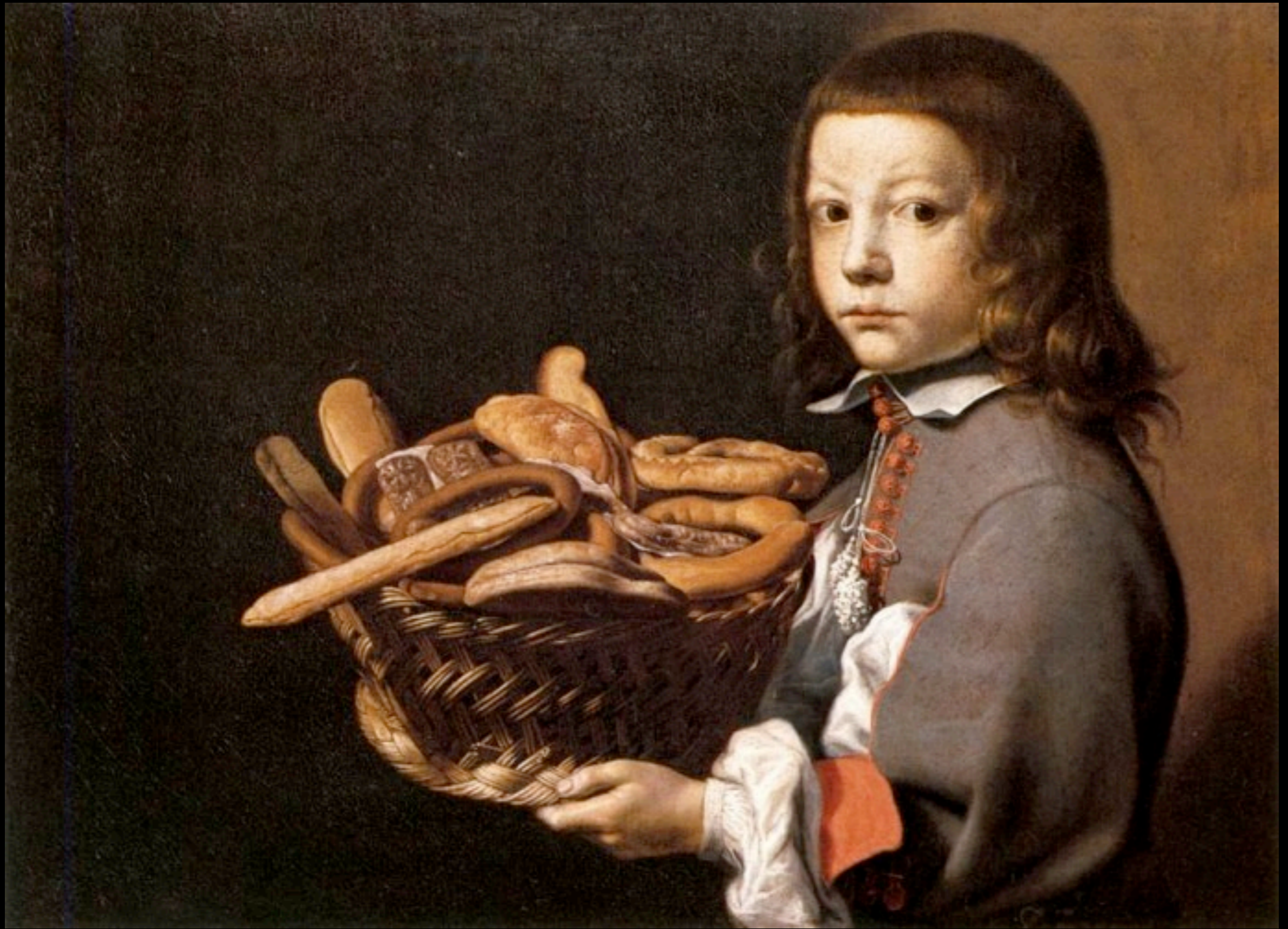
Boy with a Basket of Bread by Evaristo Baschenis c. 1665