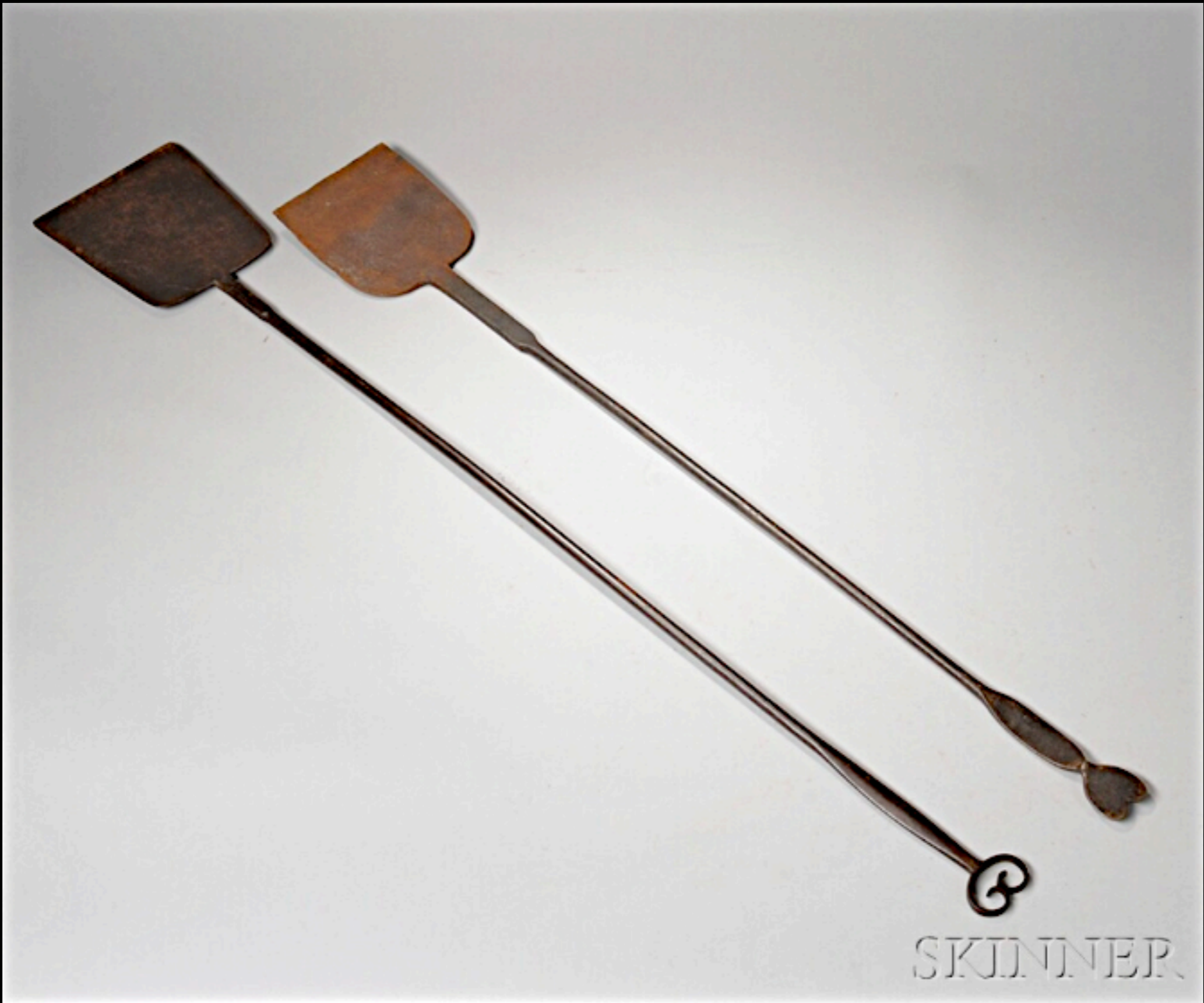
American Wrought Iron Peel Late 18th - Early 19th Century (Skinner - The Howard Roth Collection)