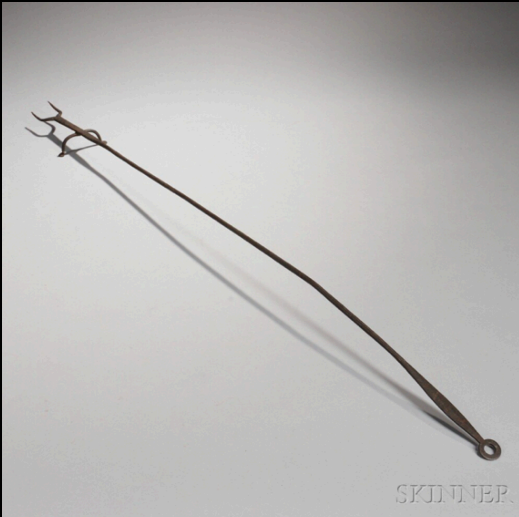
American Wrought Iron Toasting Fork Late 18th - Early 19th Century (Skinner - The Howard Roth Collection)