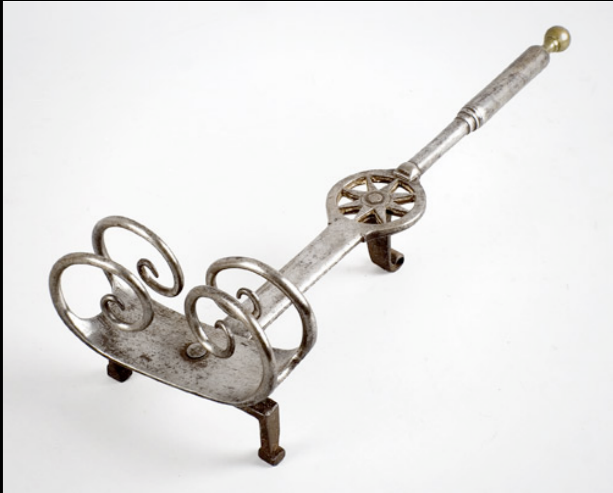
Iron and Brass Swivel Toaster 18th Century (Private Collection)