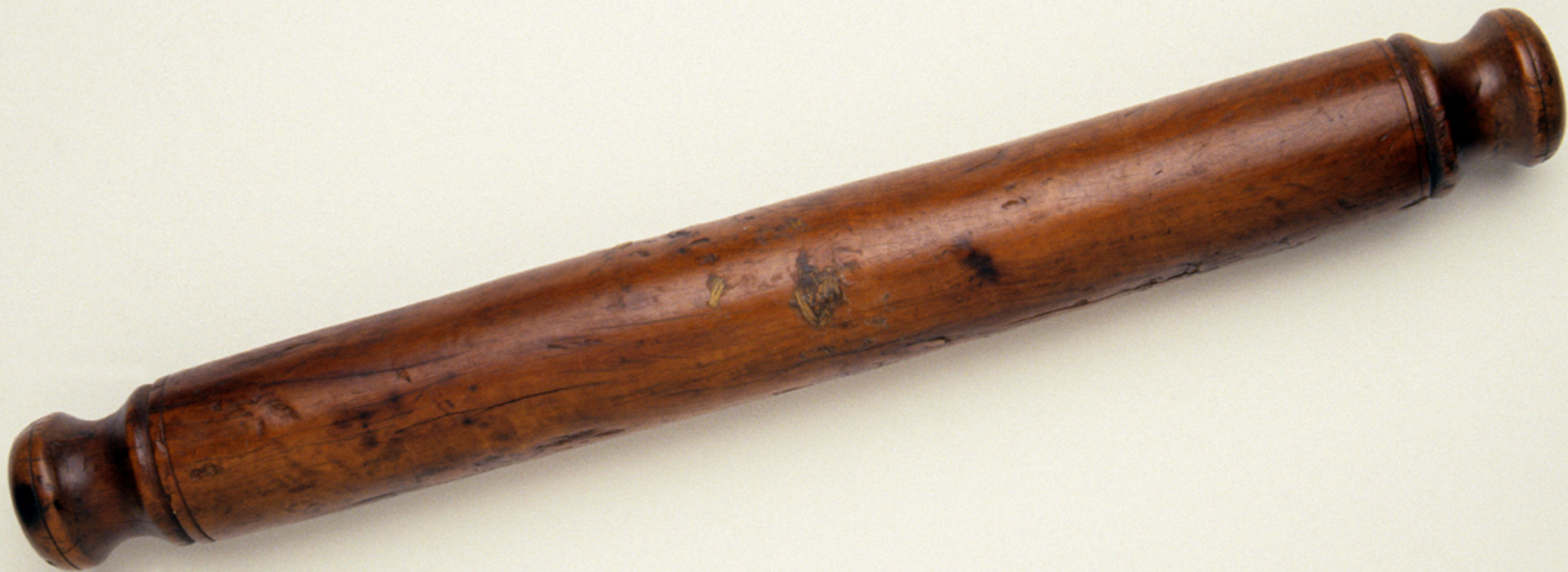
New England Rolling Pin c. 1700 - 1800 (Winterthur)