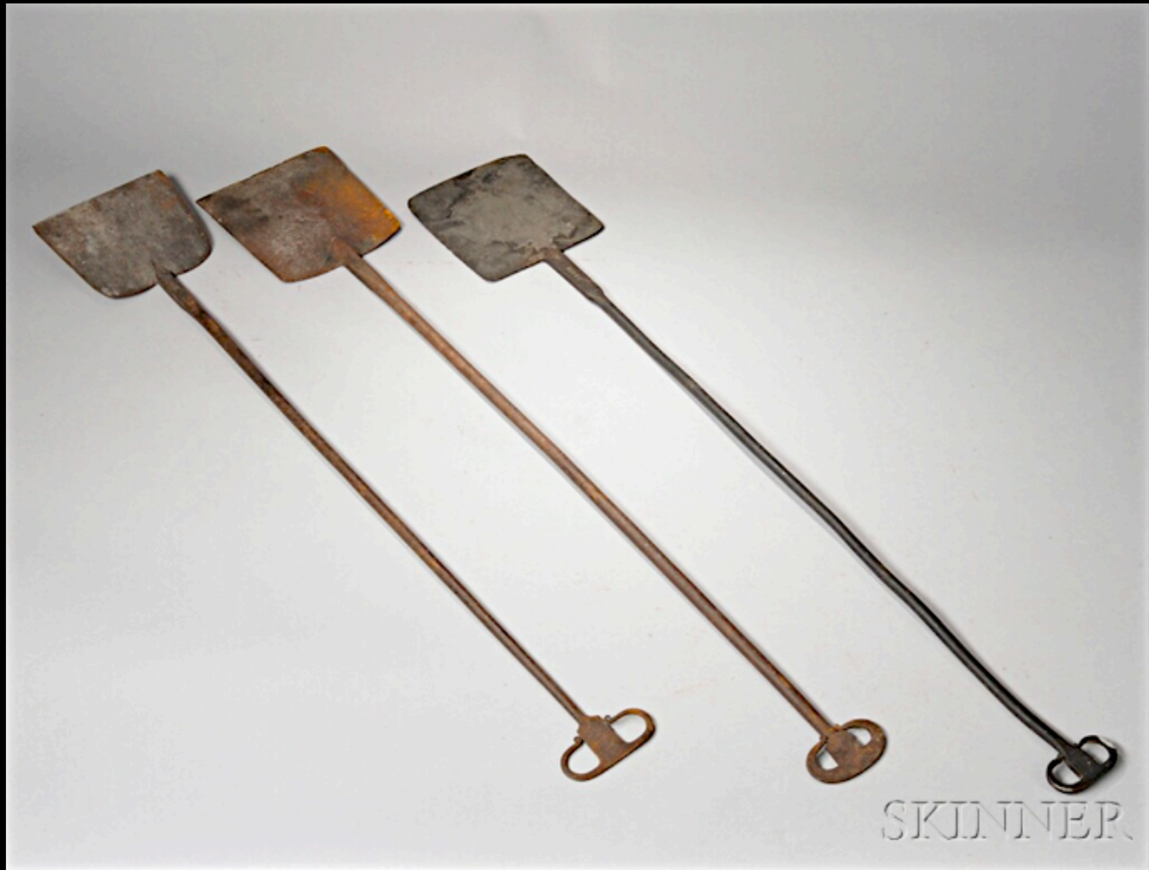
American Wrought Iron Peel Late 18th - Early 19th Century (Skinner - The Howard Roth Collection)