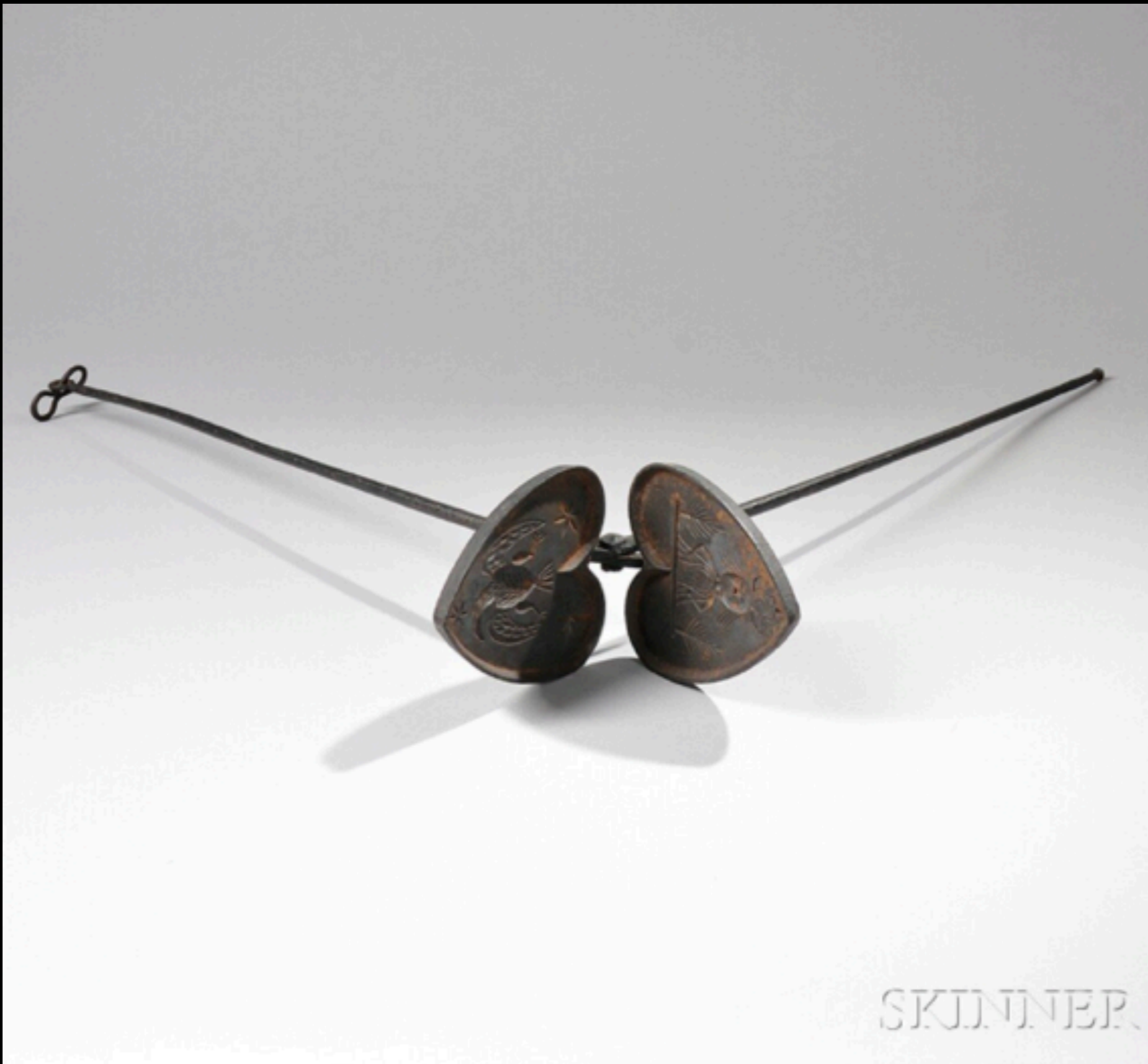
American Cast & Wrought Iron Waffle Iron Marked "D.B & H.S. Co." Late 18th - Early 19th Century