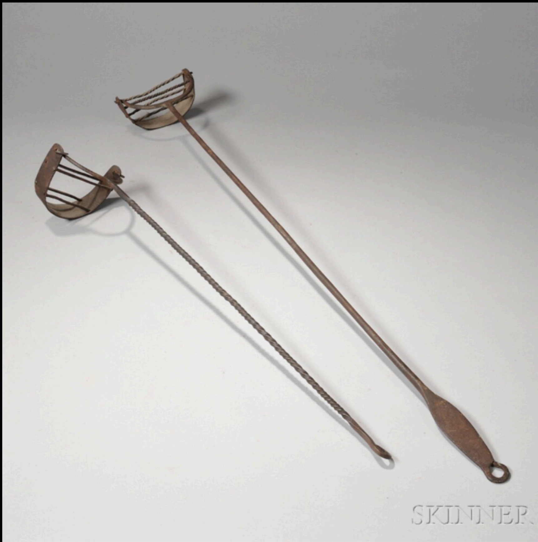
Two American Wrought Iron Hanging Toasters Late 18th - Early 19th Century