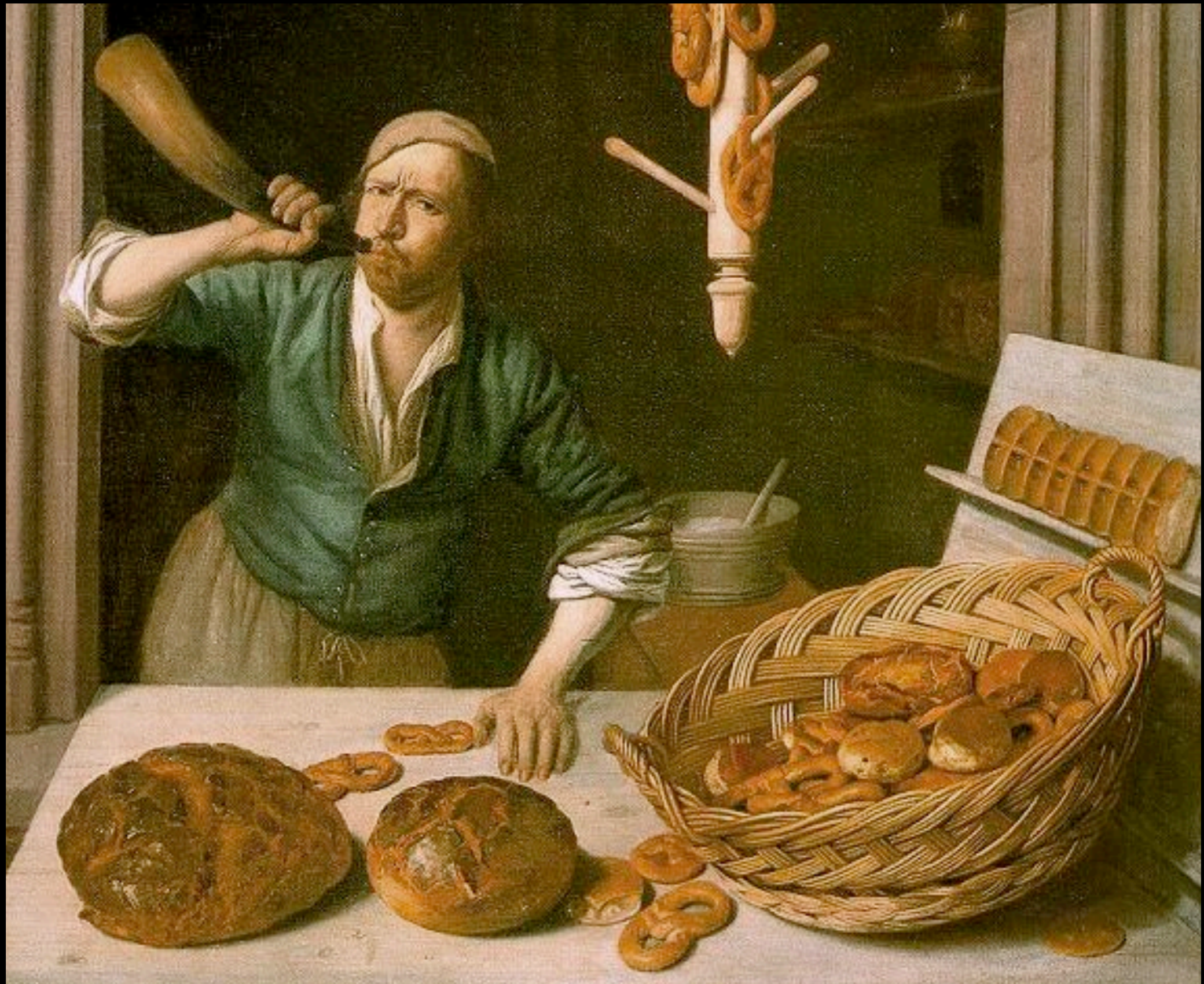
A Baker Selling His Goods by Job Adriaenszoon Berckheyde (27 January 1630 – 10 June 1698)