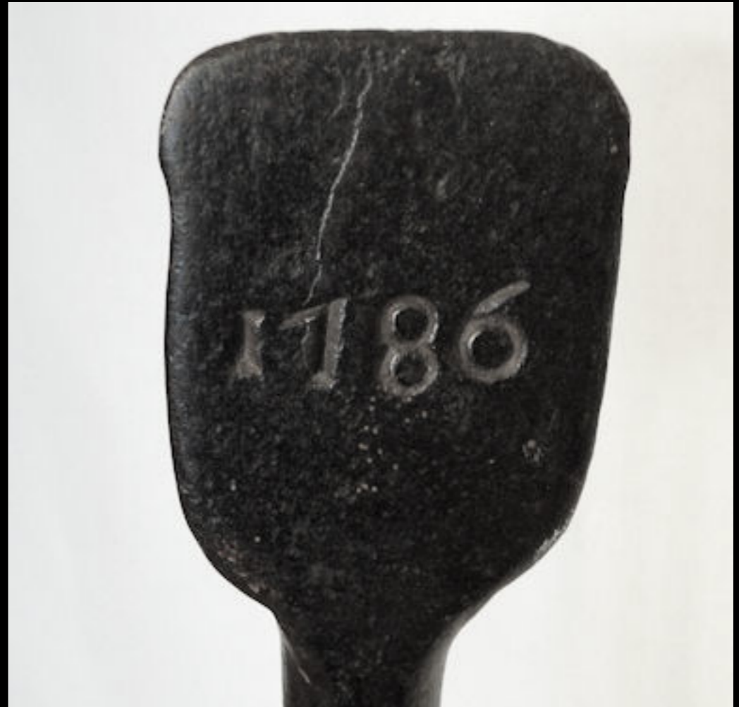
New England Iron Peel 1786 (Sharon Platt)