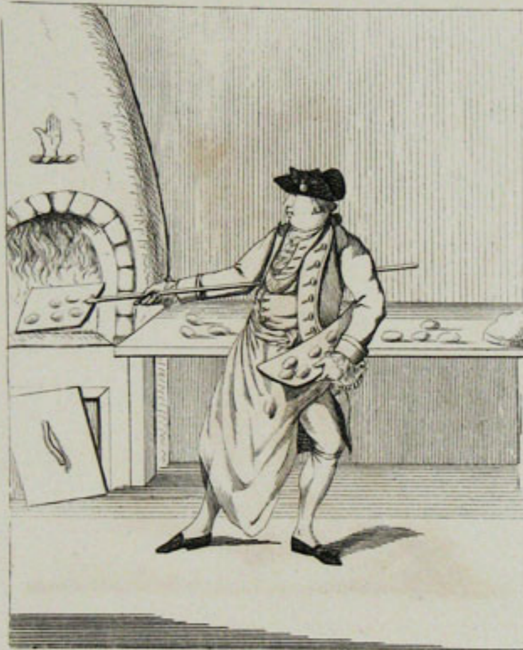
Captain BUN Quixote attacking the OVEN.