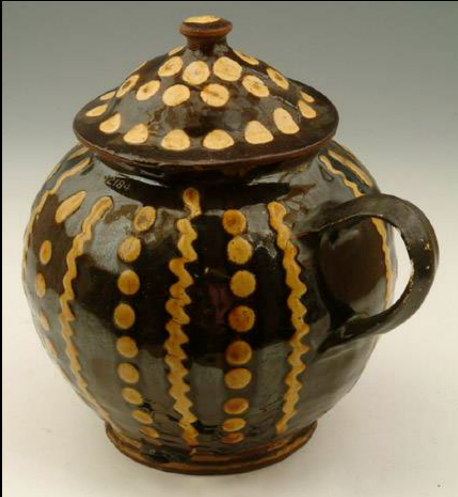
Slip Decorated "Jar" 1750 - 1800 (Museum of London)