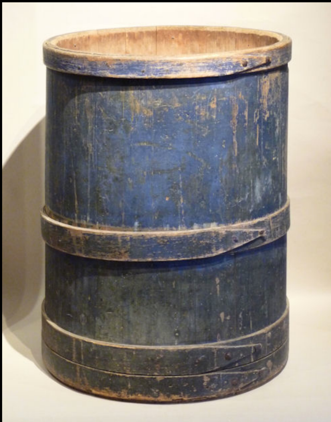
New England (Dry) Storage Barrel with Lapped Staves Secured by Rosehead Nails 18th Century (Sharon Platt)