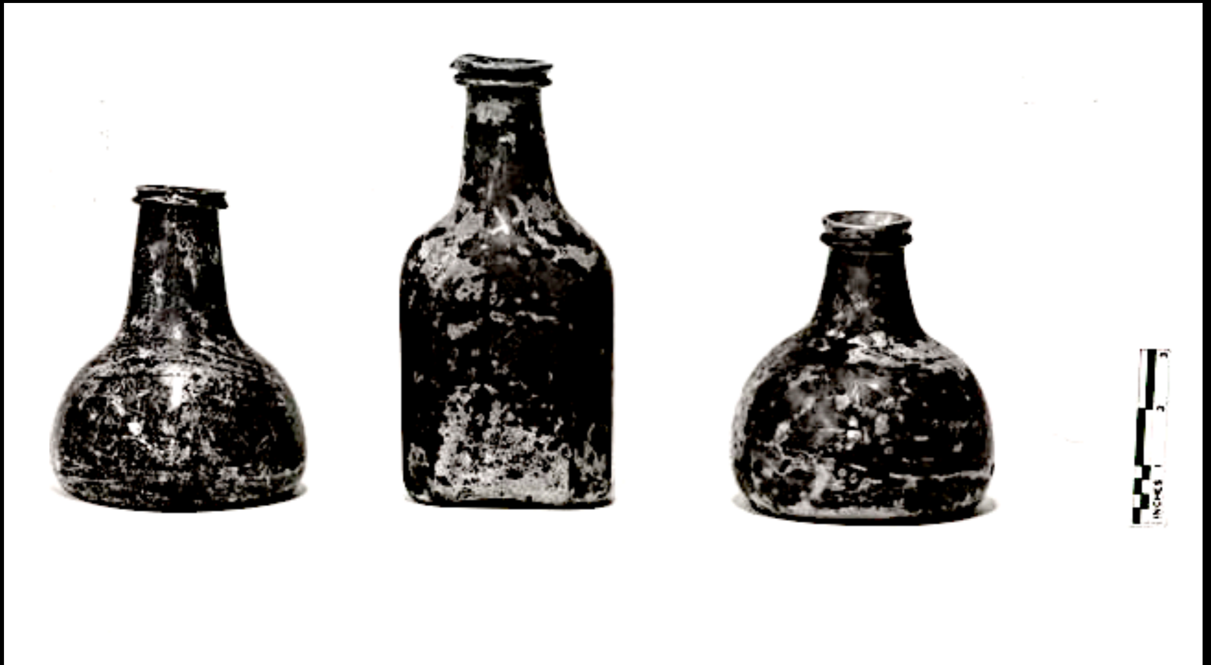
Three Wide-Mouthed Storage Bottles Found Under the Kitchen Wall of the Weherburn Tavern Center Bottle Octagonal