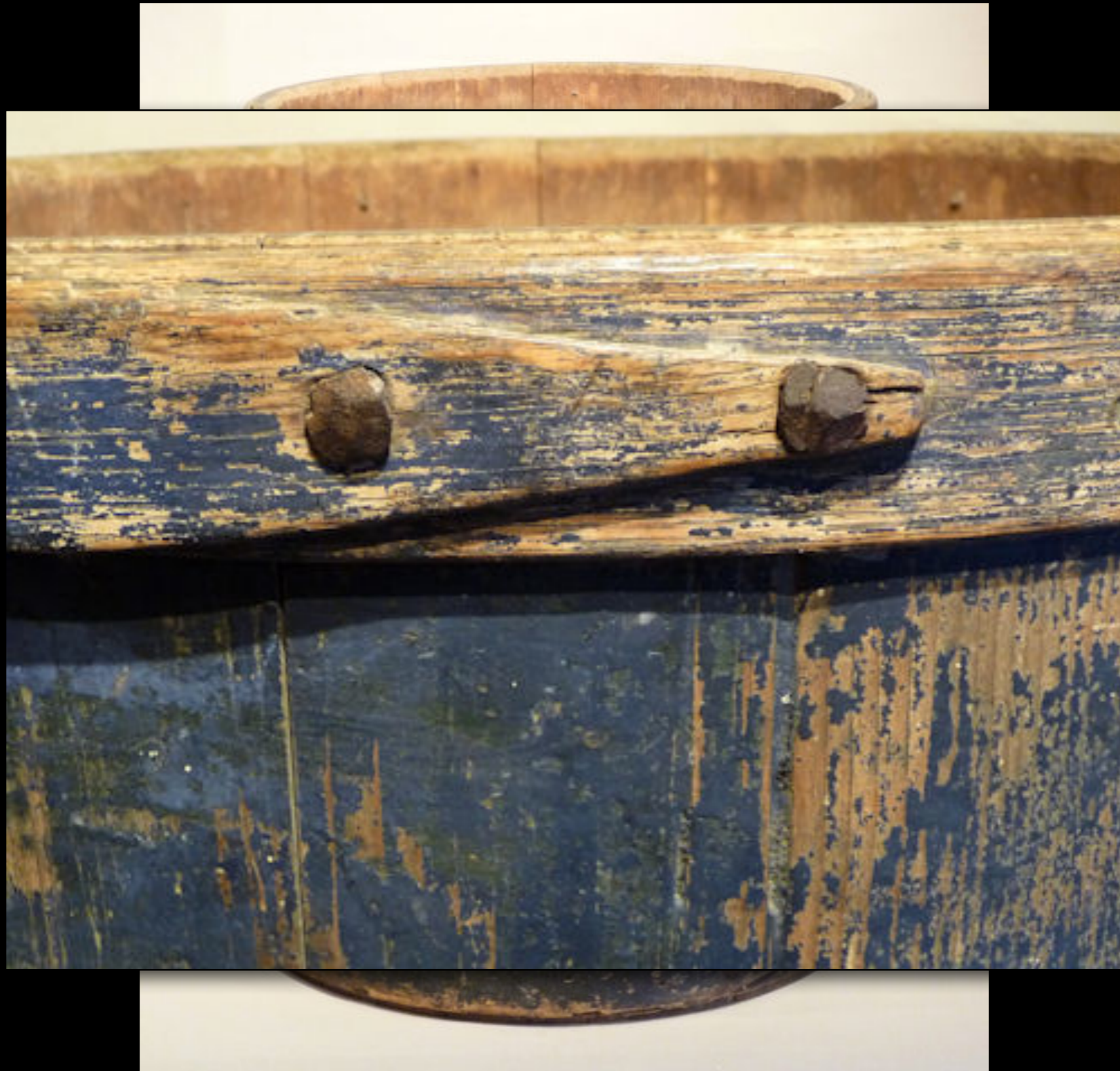
New England (Dry) Storage Barrel with Lapped Staves Secured by Rosehead Nails 18th Century (Sharon Platt)