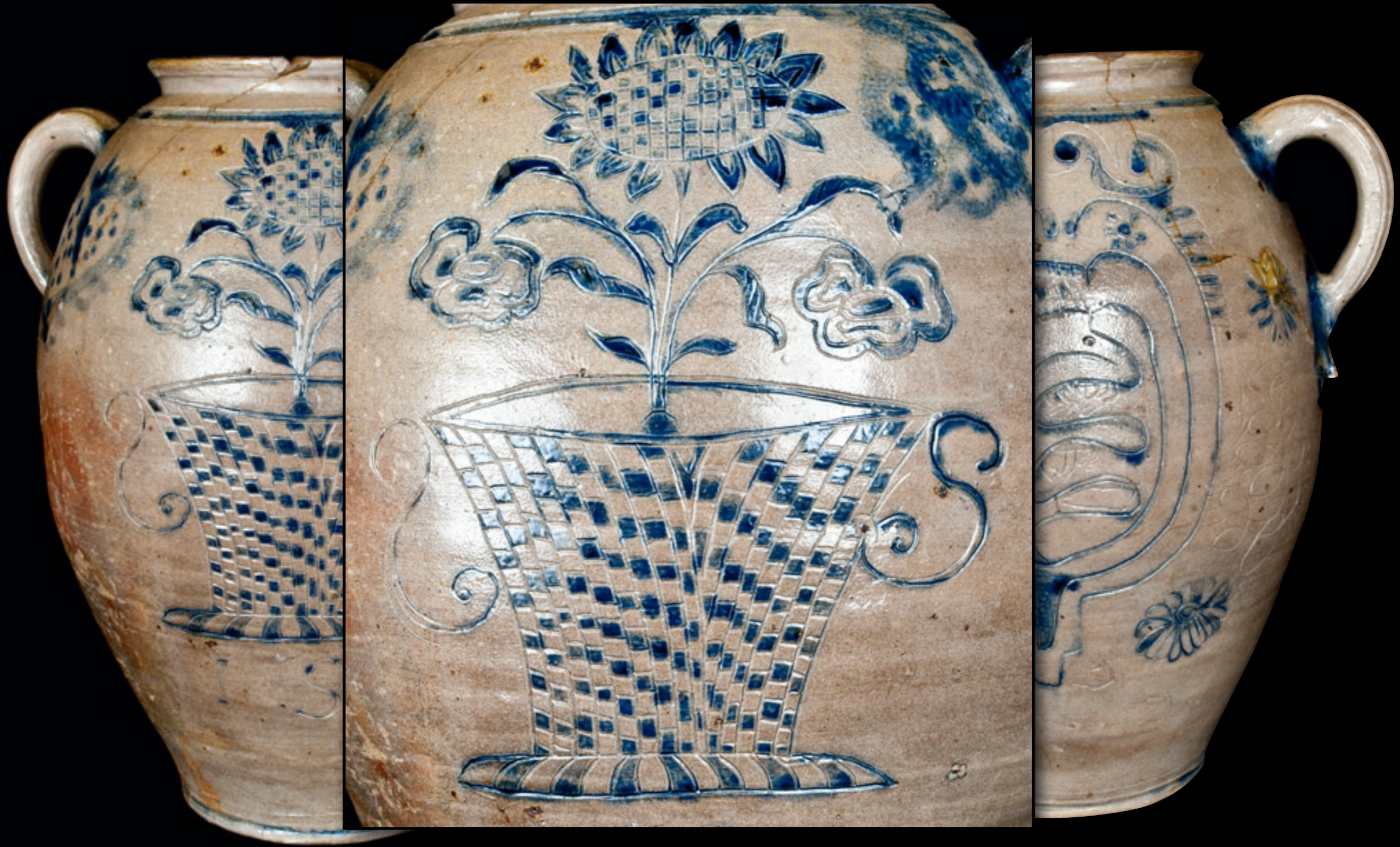
Stoneware Jar c. 1750 May be from the Kemple Pottery of Ringoes, NJ, the Morgan Pottery of Cheesequake, NJ or the Remmey or Crolius Potteries of Manhattan, New York