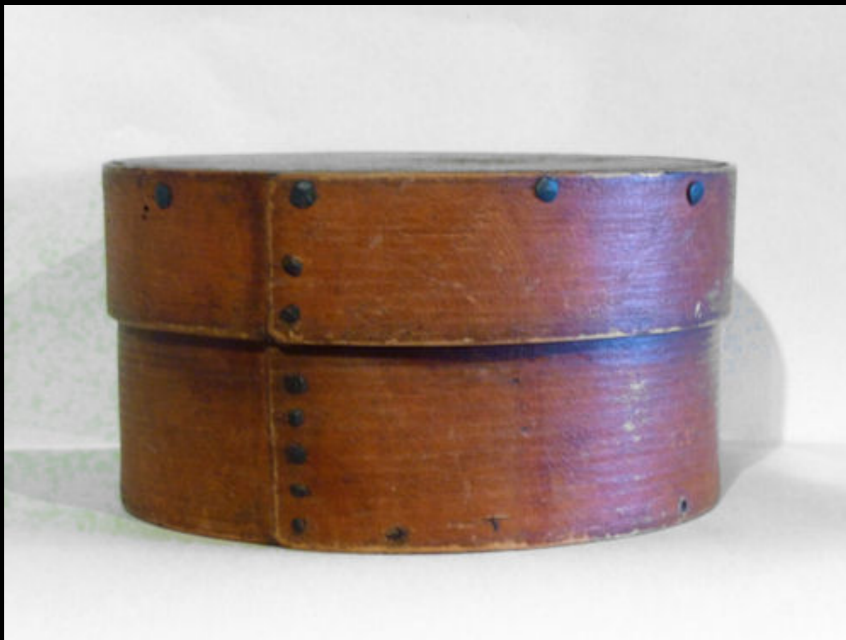
New England Pantry Box with "Bittersweet" Surface & Rosehead Nails 18th Century (Sharon Platt)