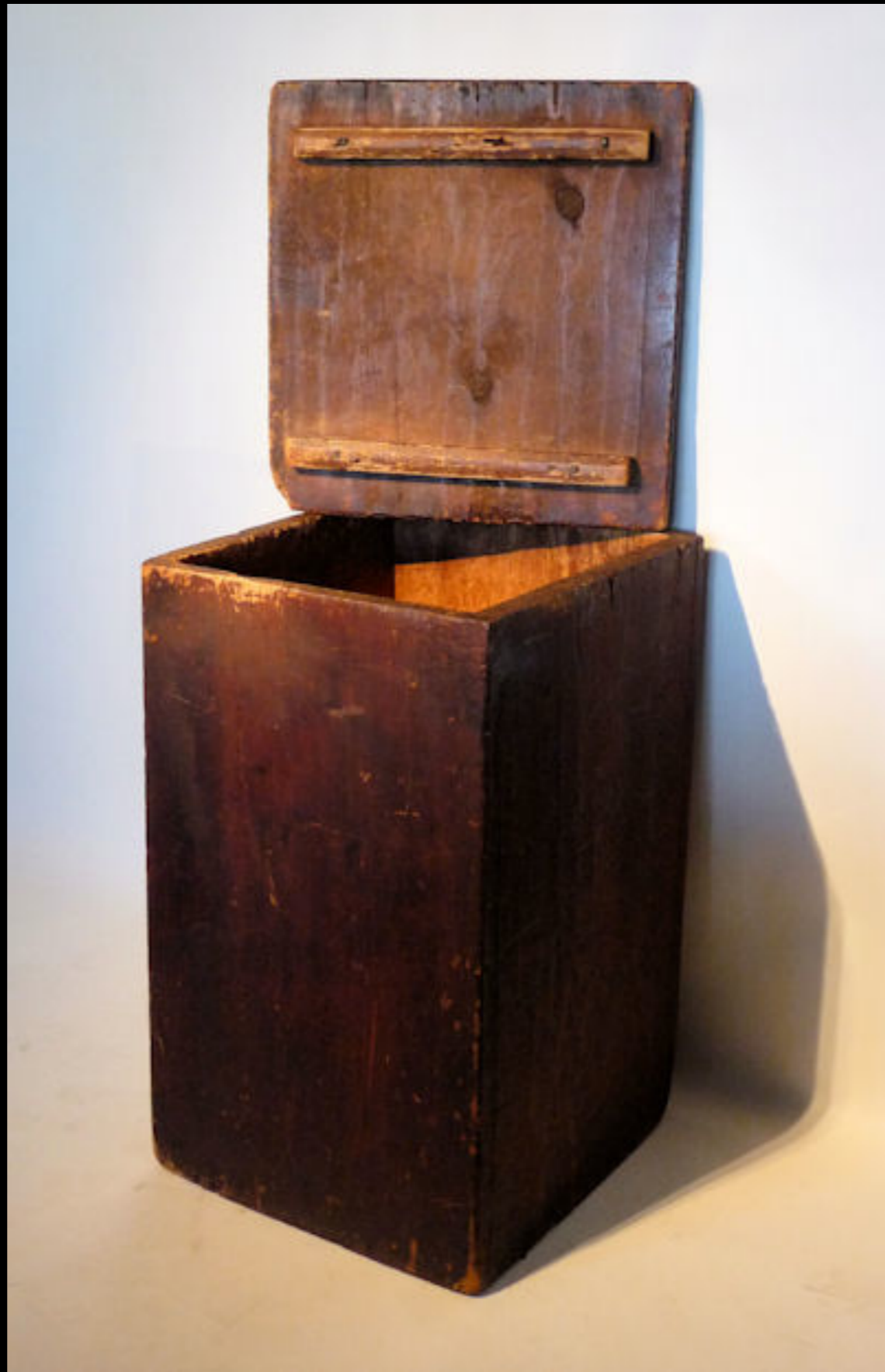
New England Pine Wood Storage Box 18th Century (Sharon Platt)