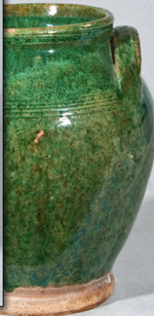
Bristol County, Massachusetts, Green Glaze Redware Jar Late 18th - Early 19th Century (Crocker Farm Auction House)