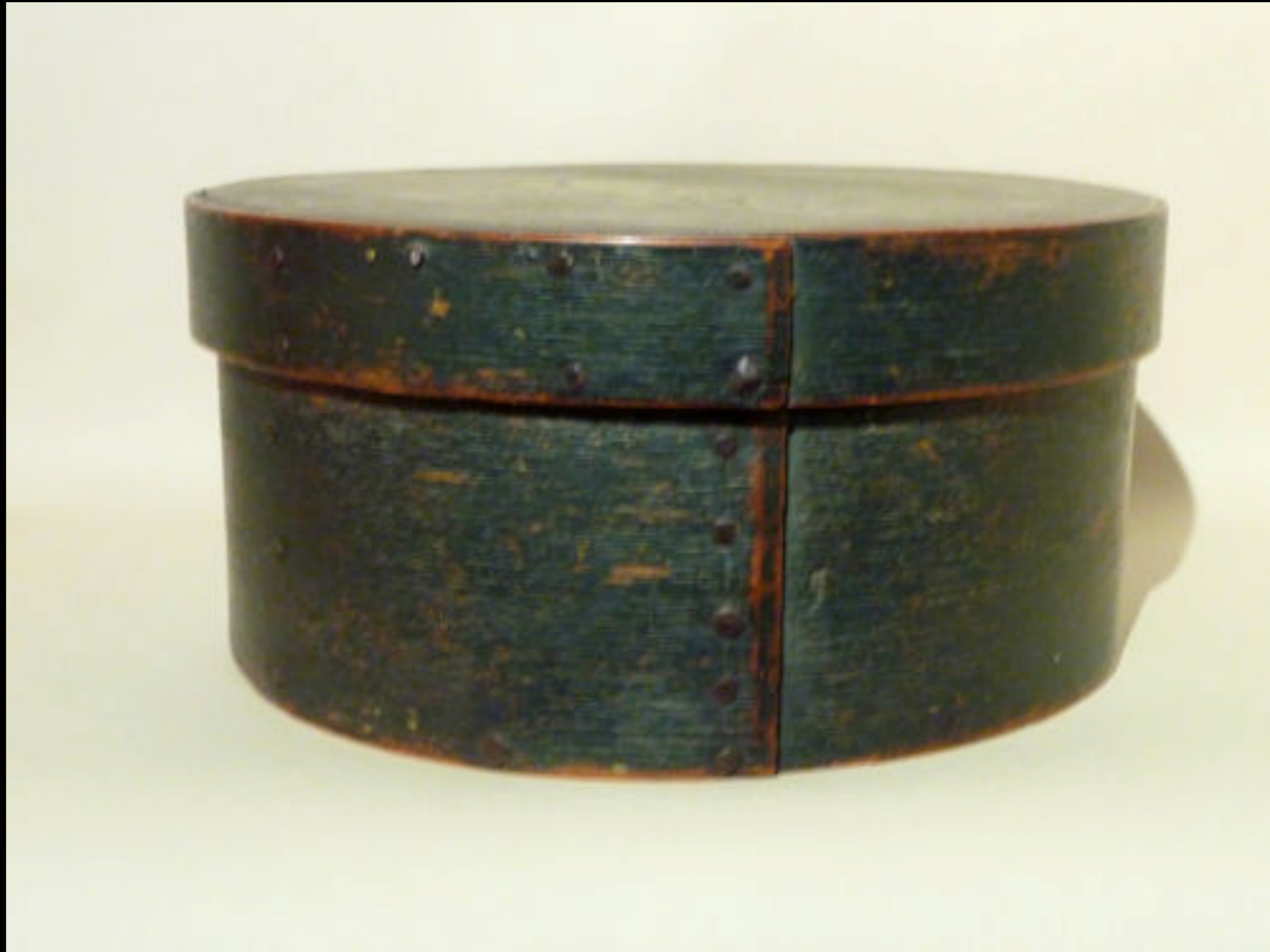
New England Pantry Oval Pantry Box in Green Paint 18th Century (Sharon Platt)