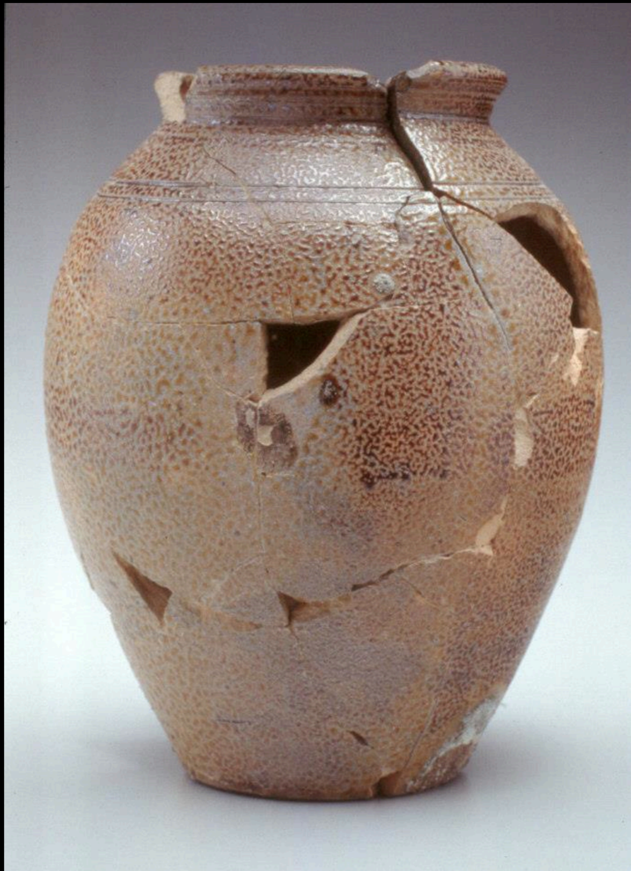
Brown Salt-glazed Stoneware Jar Excavated at Yorktown, Virginia c. 1720 - 1740 (Ceramics in America)