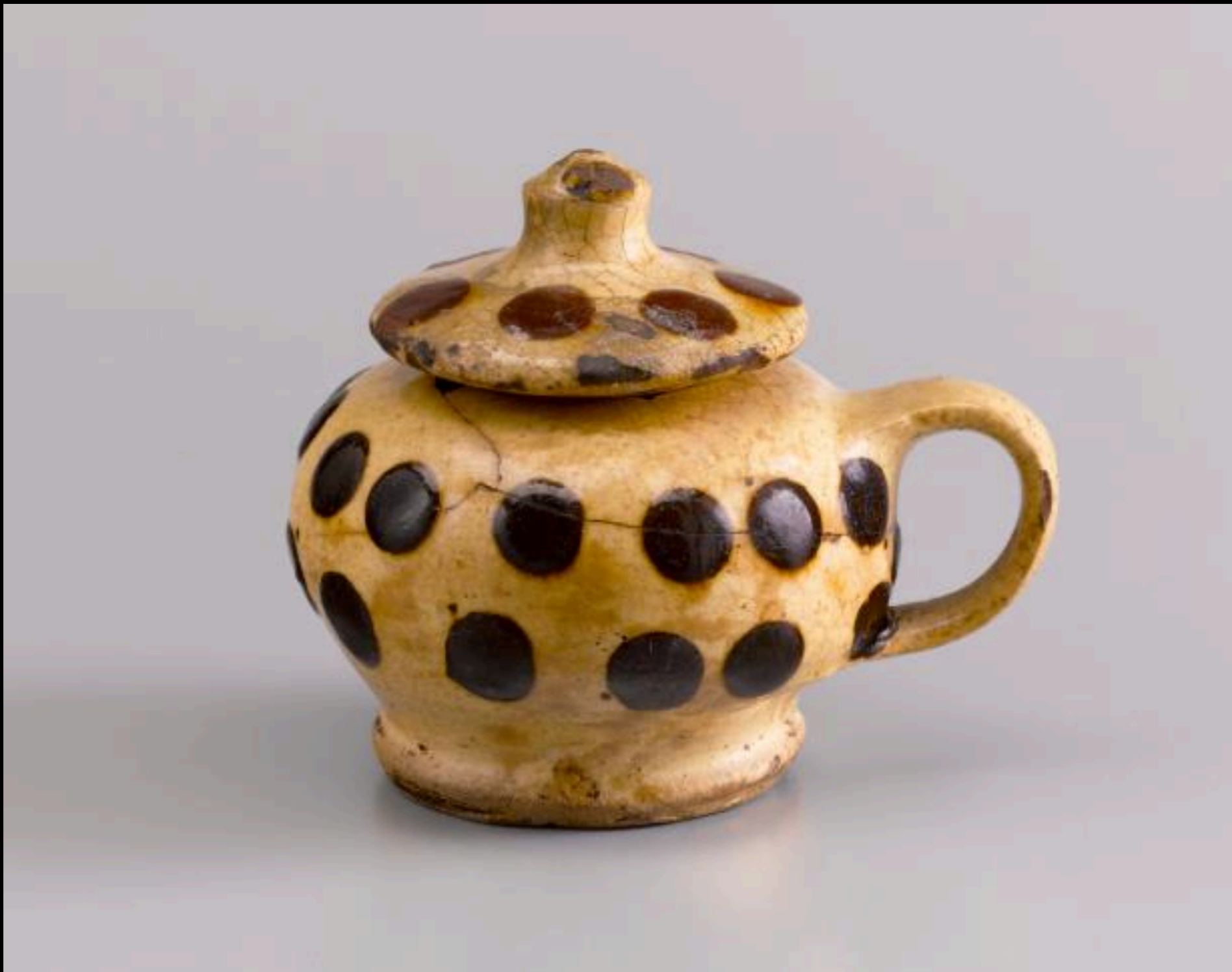
Staffordshire Covered "Pot" c. 1730 - 1750 (Ceramics in America)