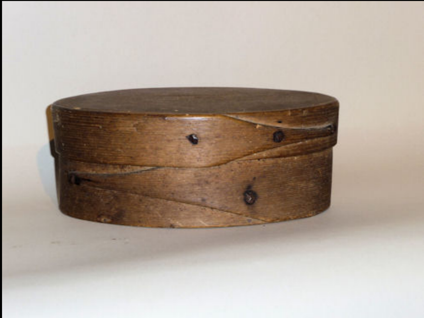
New England Pantry Oval Pantry Box 18th Century (Sharon Platt)