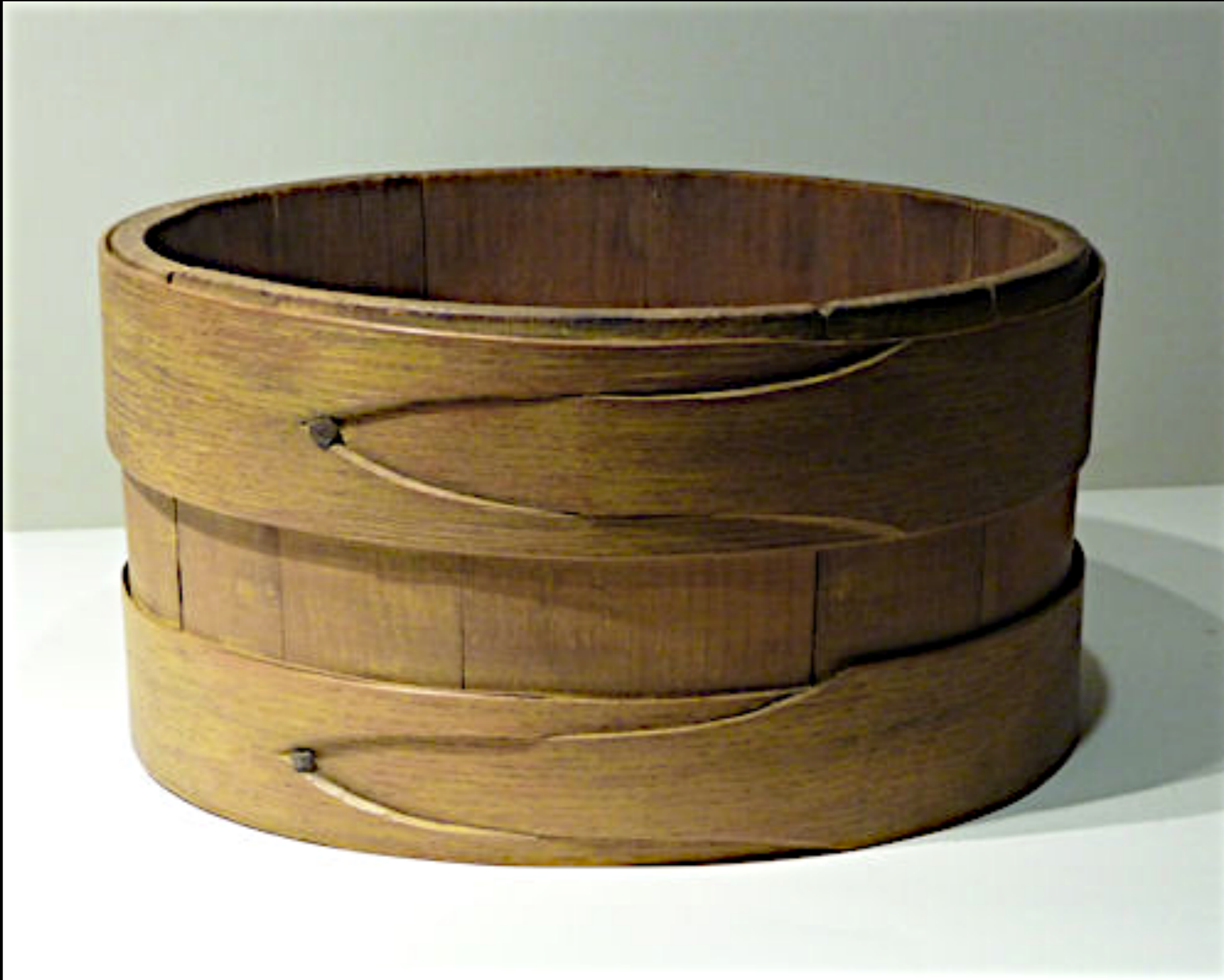
New England 12" Staved Tub with Traces of Yellow Paint 18th Century (Sharon Platt)