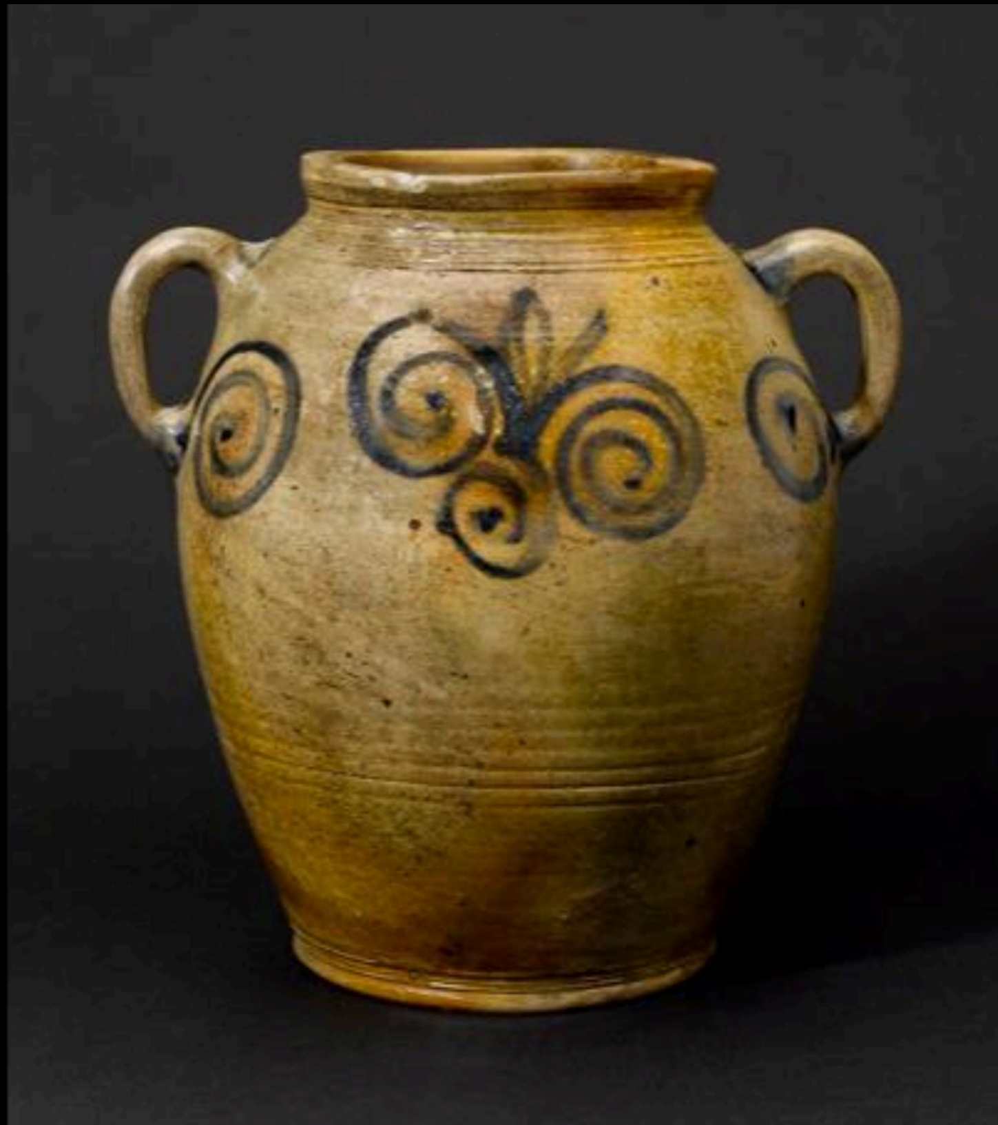
New Jersey Stoneware Jar with Watch Spring Cobalt Decorations