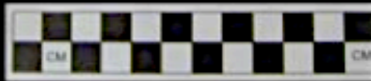
Feature 88 British Barracks