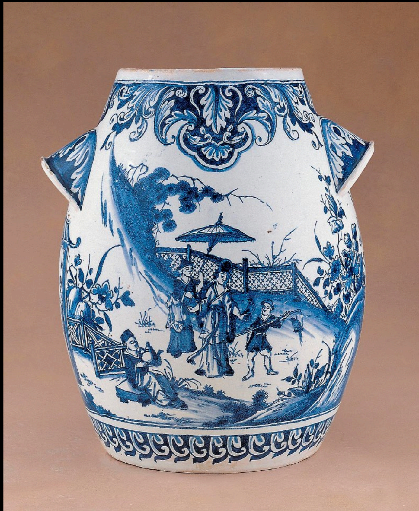
Chinoiserie Cistern/Cooler, London Delft