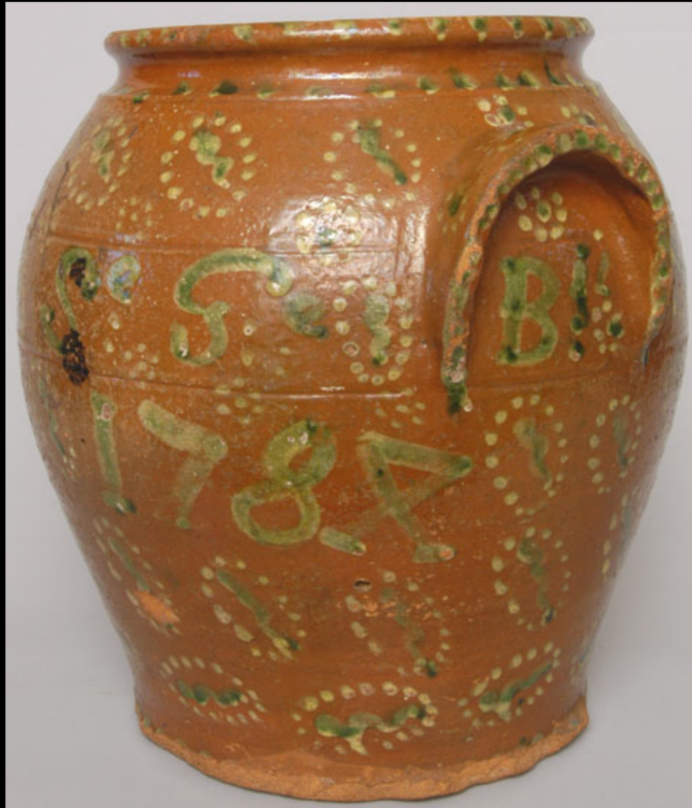
Redware Jar Dated 1784 and Initialed "S.G." Southern United States (Crocker Farm Auction)