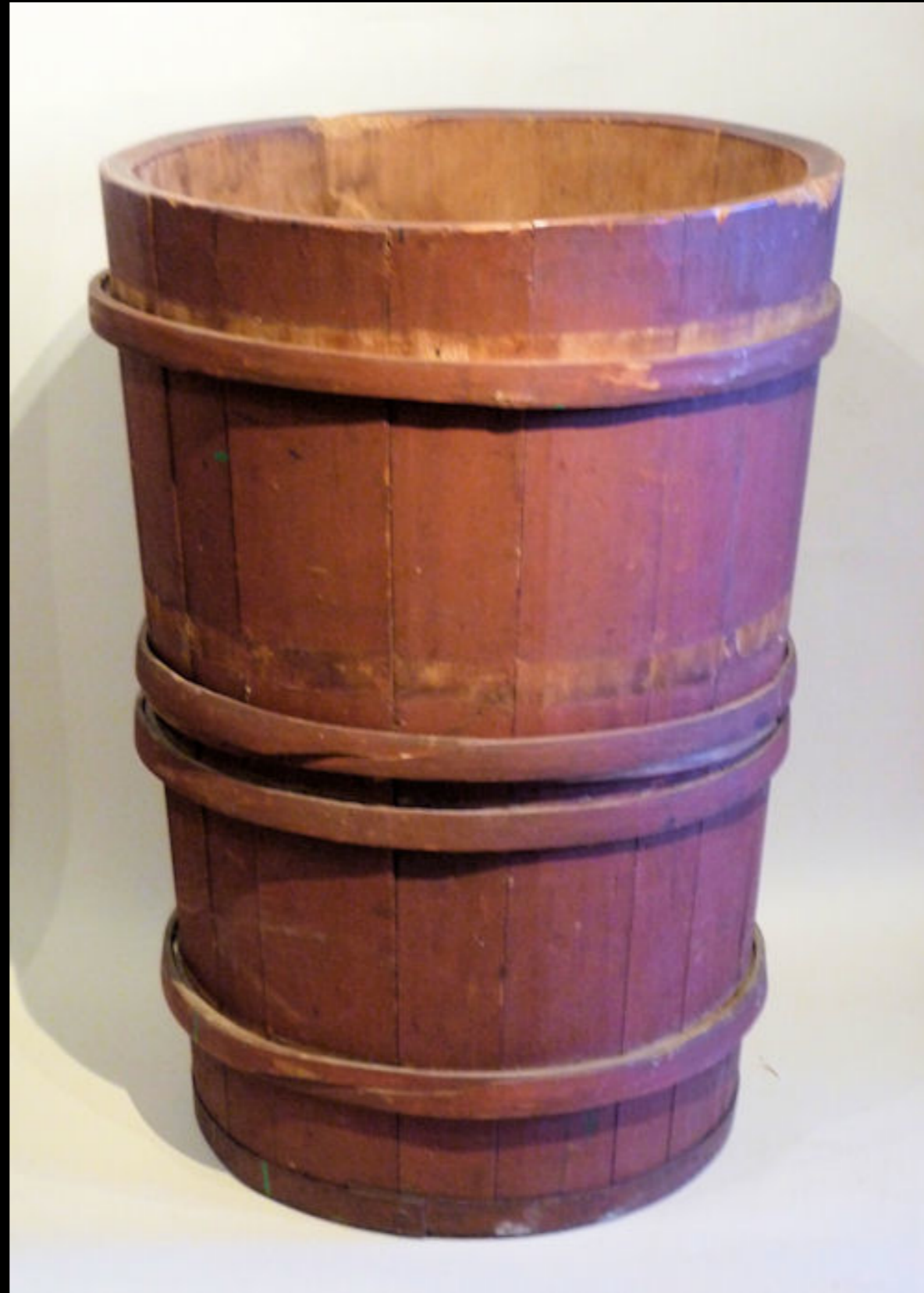
New England Dry Storage Lap Joint Barrel in Red Paint c. 1800 (Sharon Platt)