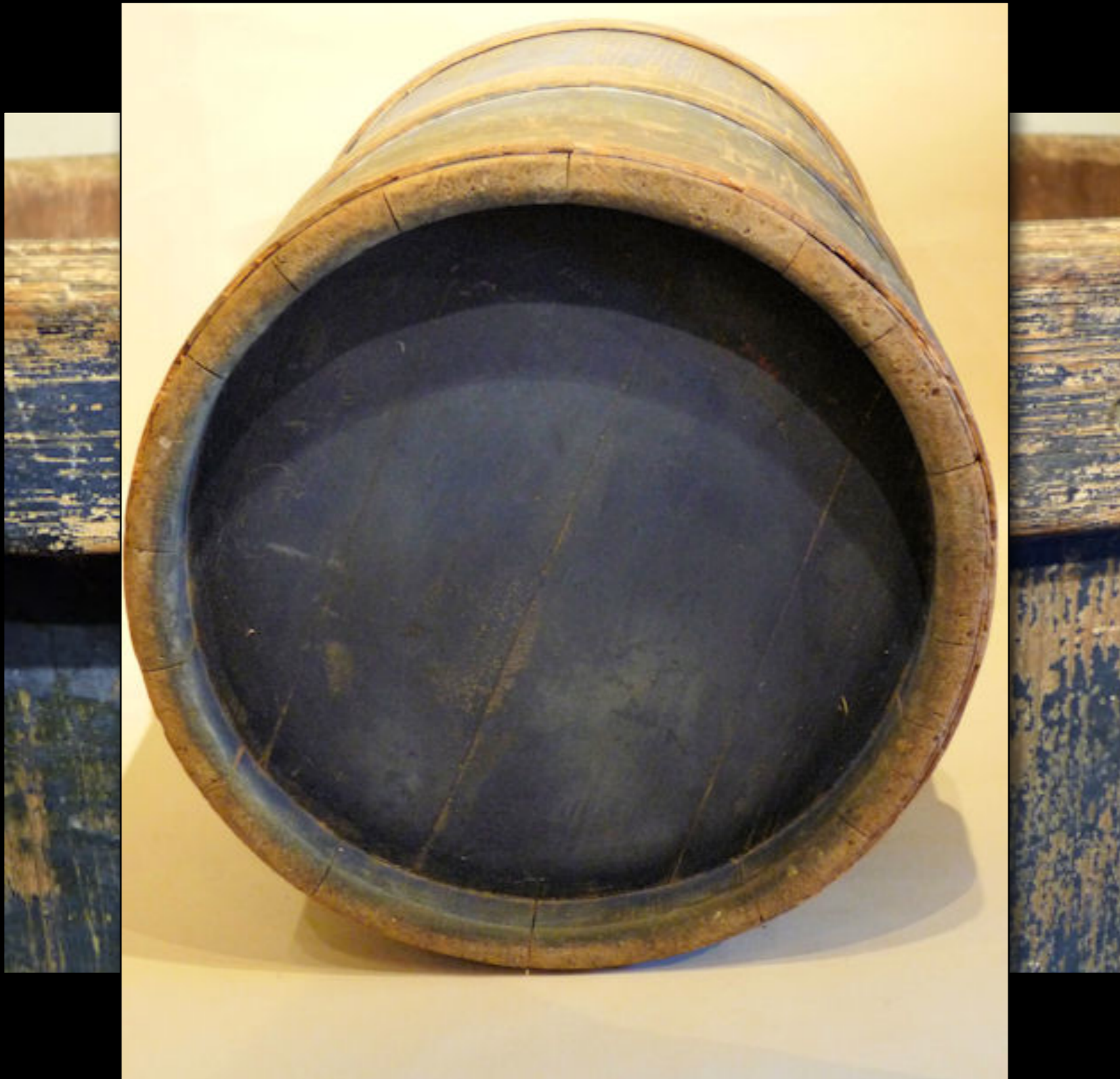
New England (Dry) Storage Barrel with Lapped Staves Secured by Rosehead Nails 18th Century (Sharon Platt)