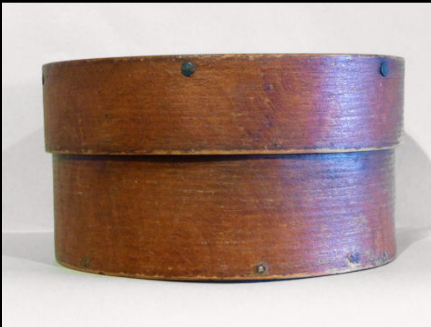
New England Pantry Box with "Bittersweet" Surface & Rosehead Nails 18th Century (Sharon Platt)