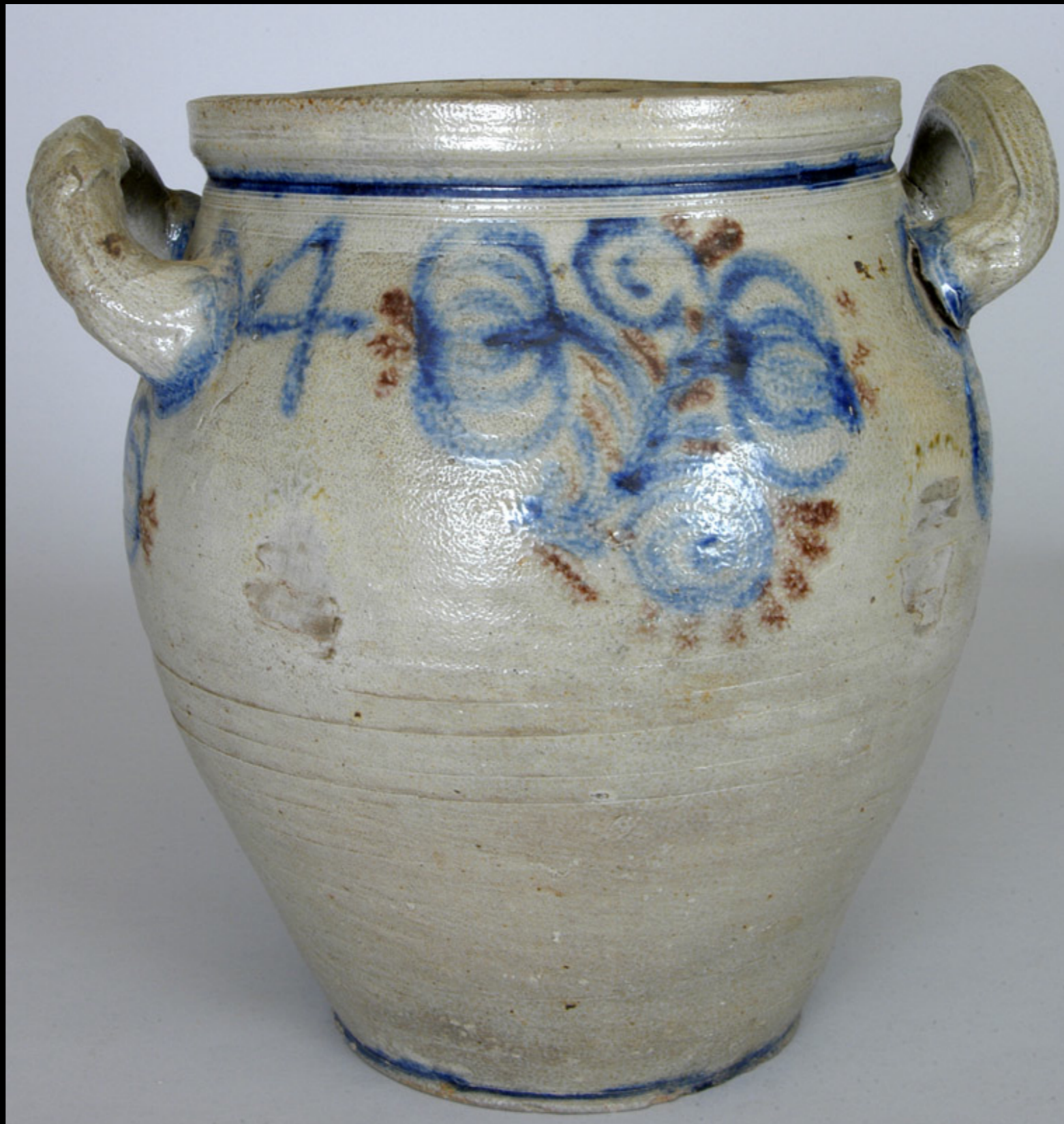
4 Gallon New Jersey Stoneware Jar Late 18th Century (Crocker Farm Auction House)