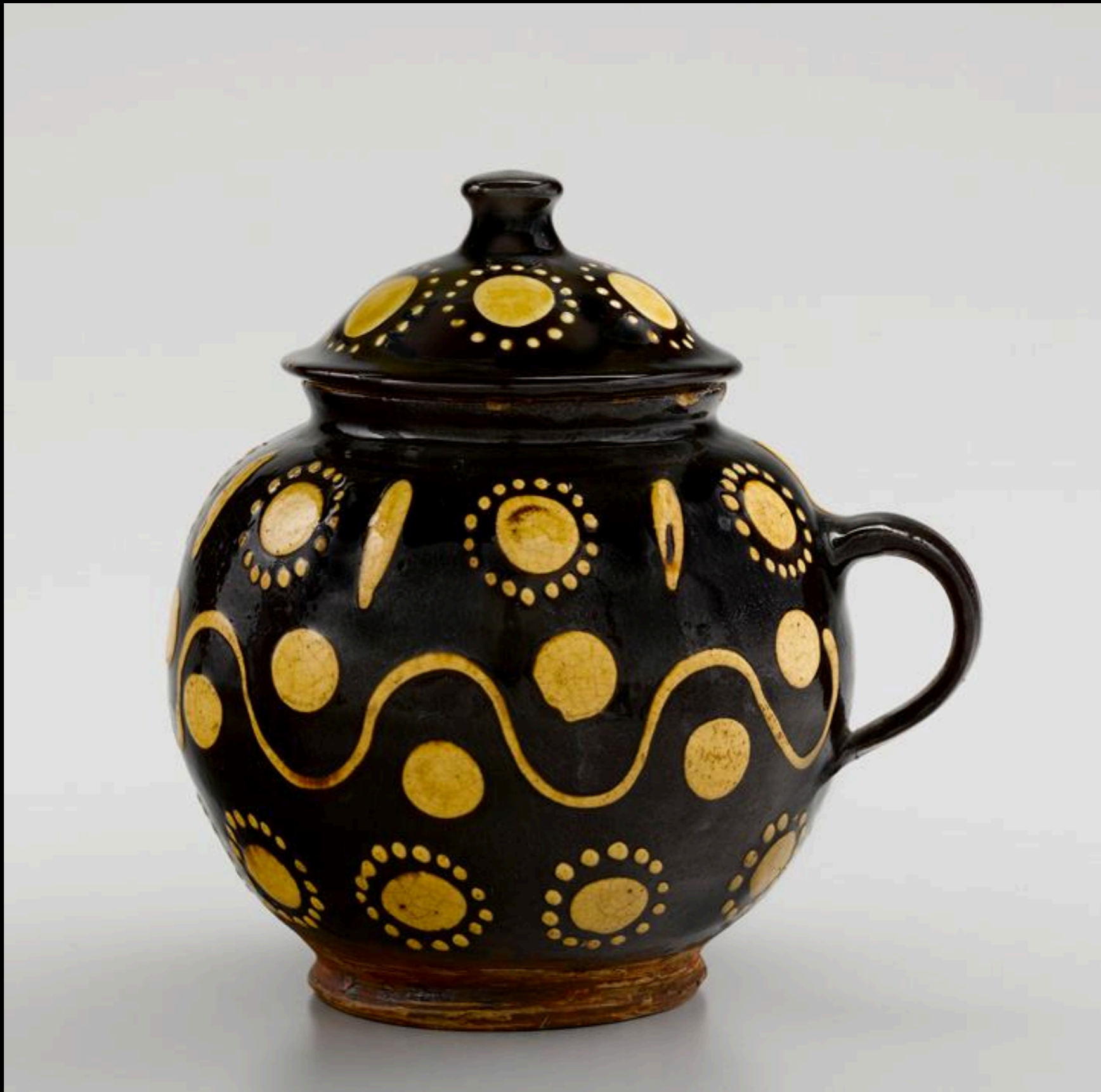
Staffordshire Slip Decorated "Jug"