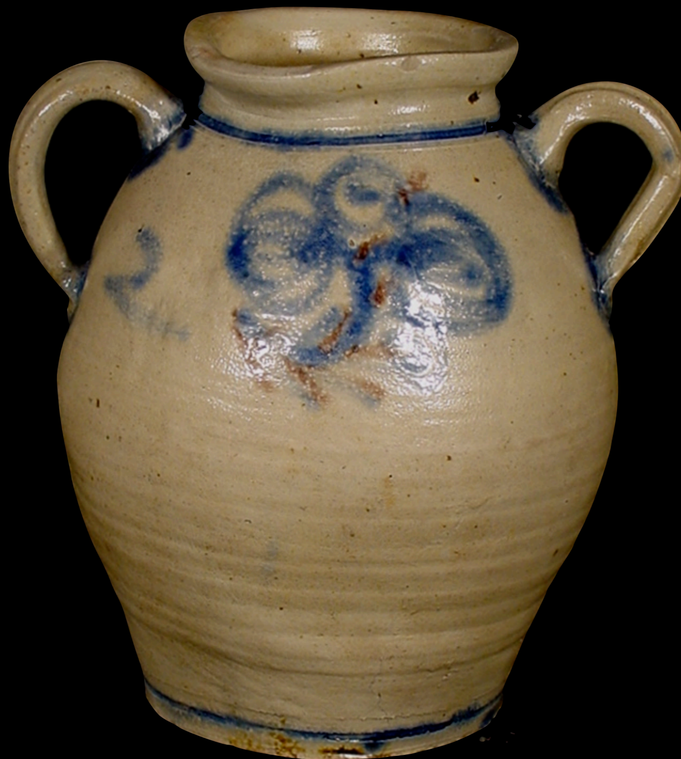
New Jersey 2 Gallon Stoneware Jar with Watch Spring Cobalt Decorations 18th Century (Early American Stoneware)