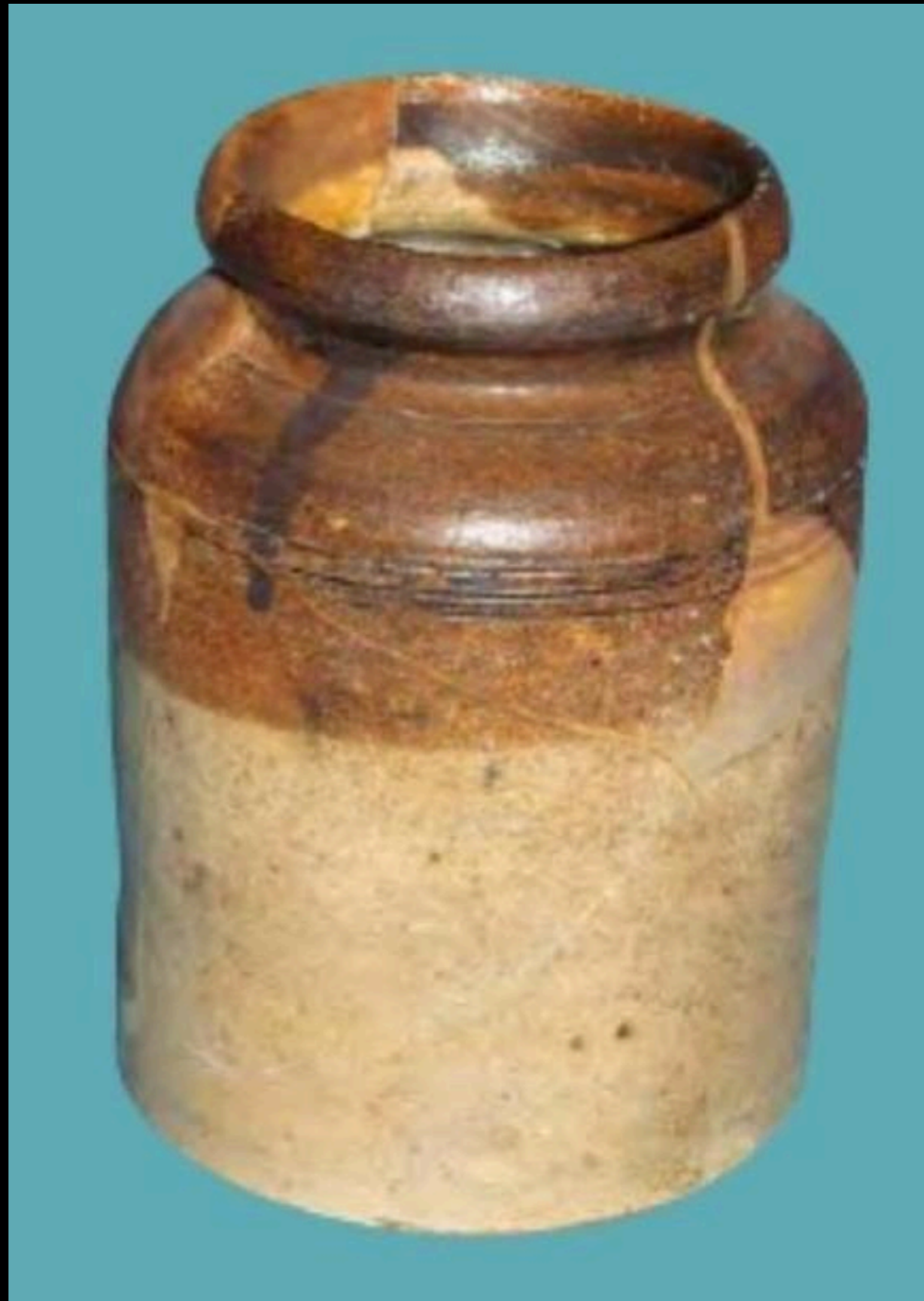
Brown Stoneware Storage Jar Found in the Wreck of the General Carleton c. 1785 (Polish Maritime Museum)