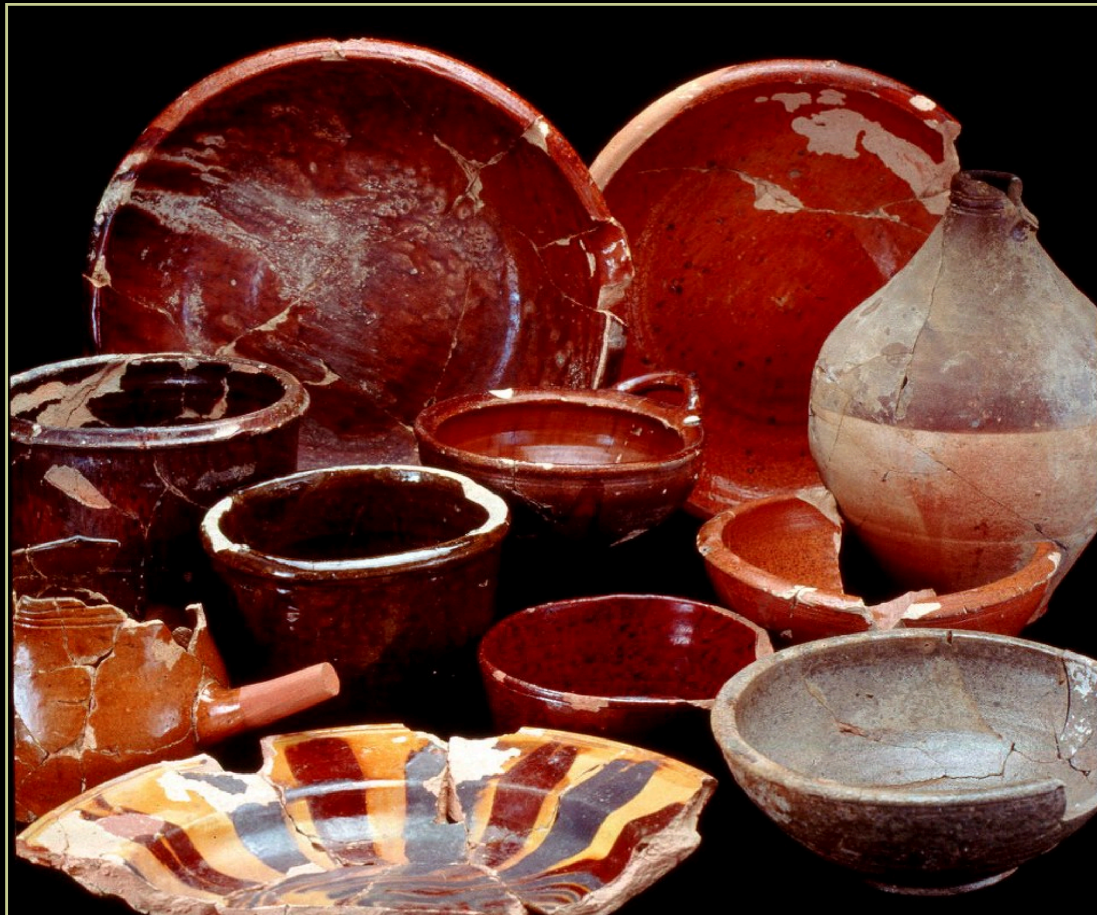
Wares of the Poor Potter of Yorktown, Virginia c. 1720 - 1745