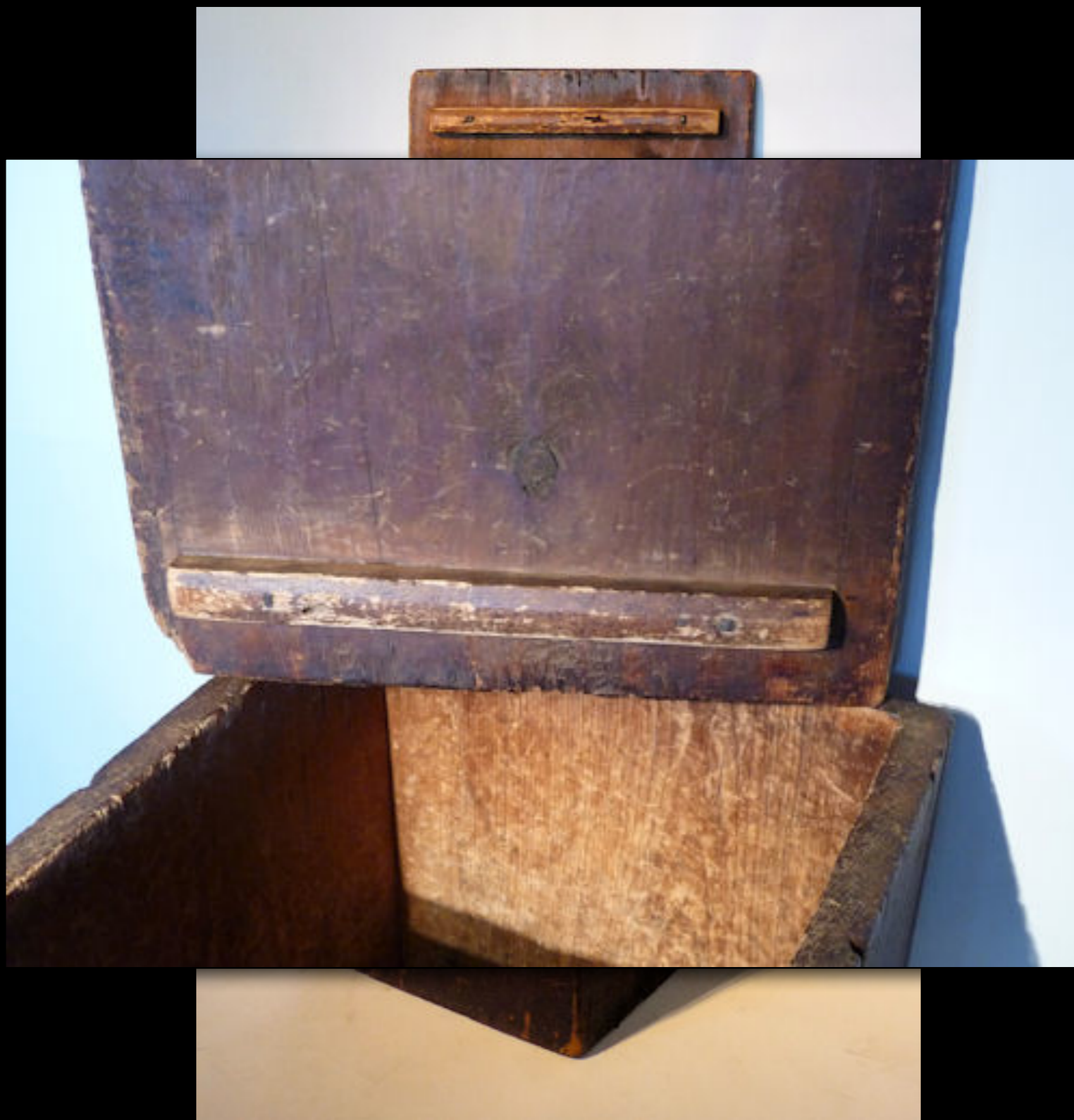
New England Pine Wood Storage Box 18th Century (Sharon Platt)