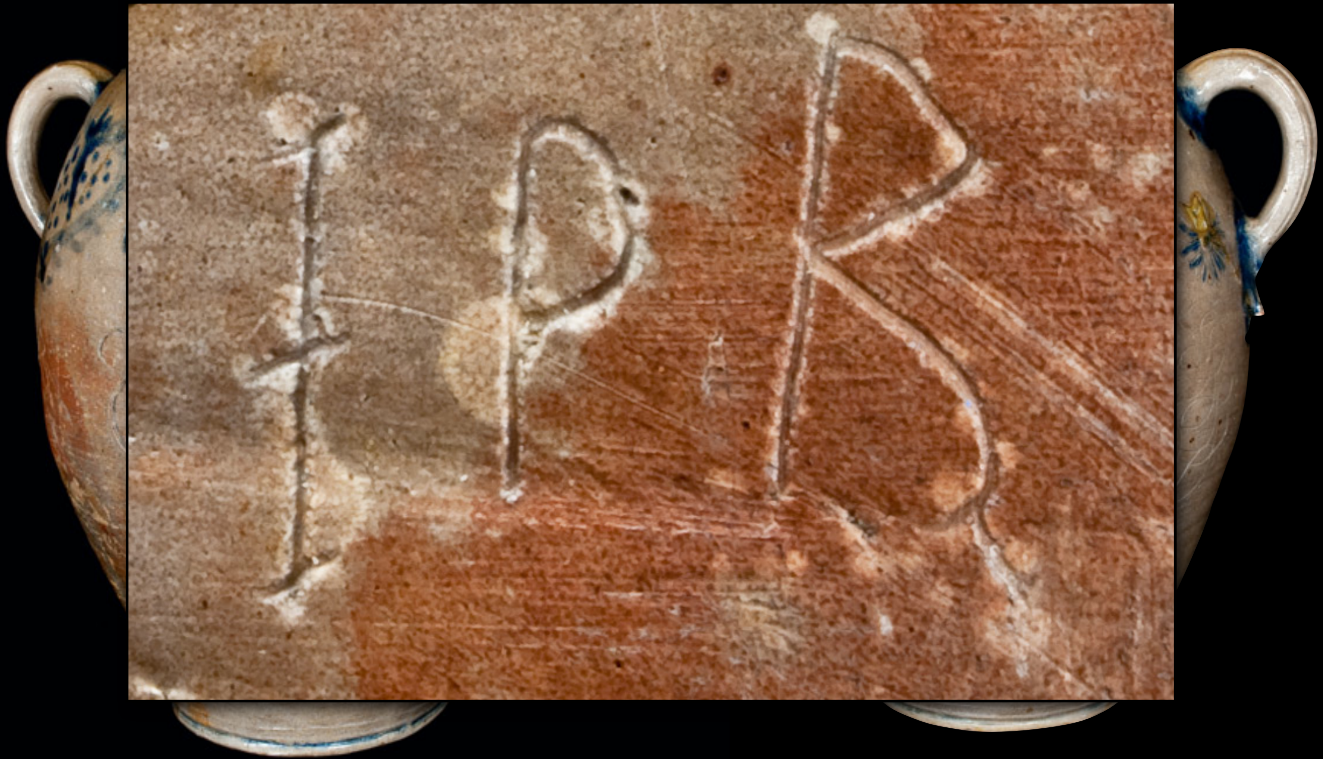
Stoneware Jar c. 1750 May be from the Kemple Pottery of Ringoes, NJ, the Morgan Pottery of Cheesequake, NJ or the Remmey or Crolius Potteries of Manhattan, New York