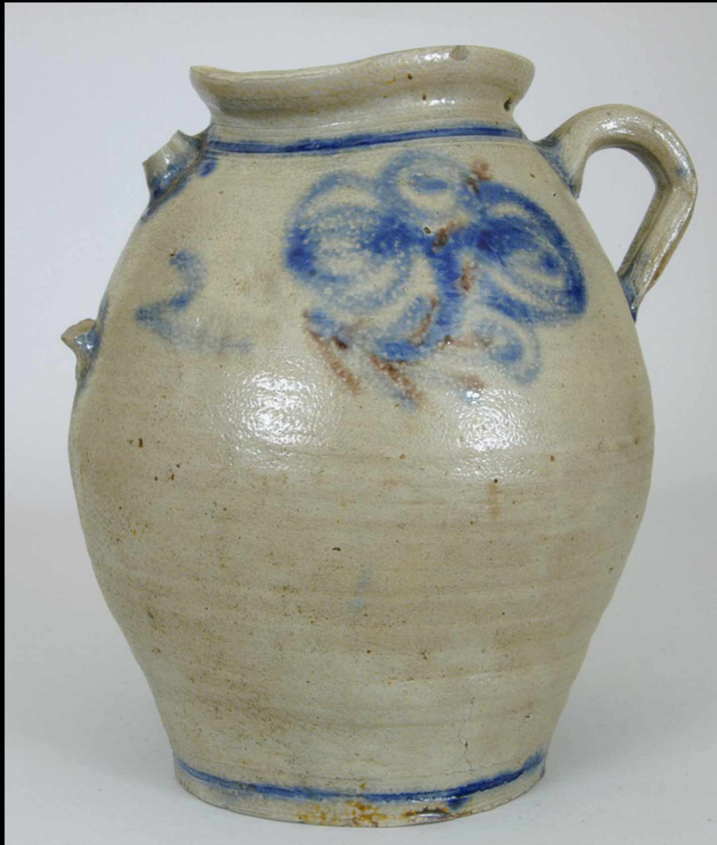
2 Gallon New Jersey Stoneware Jar Late 18th Century (Crocker Farm Auction House)