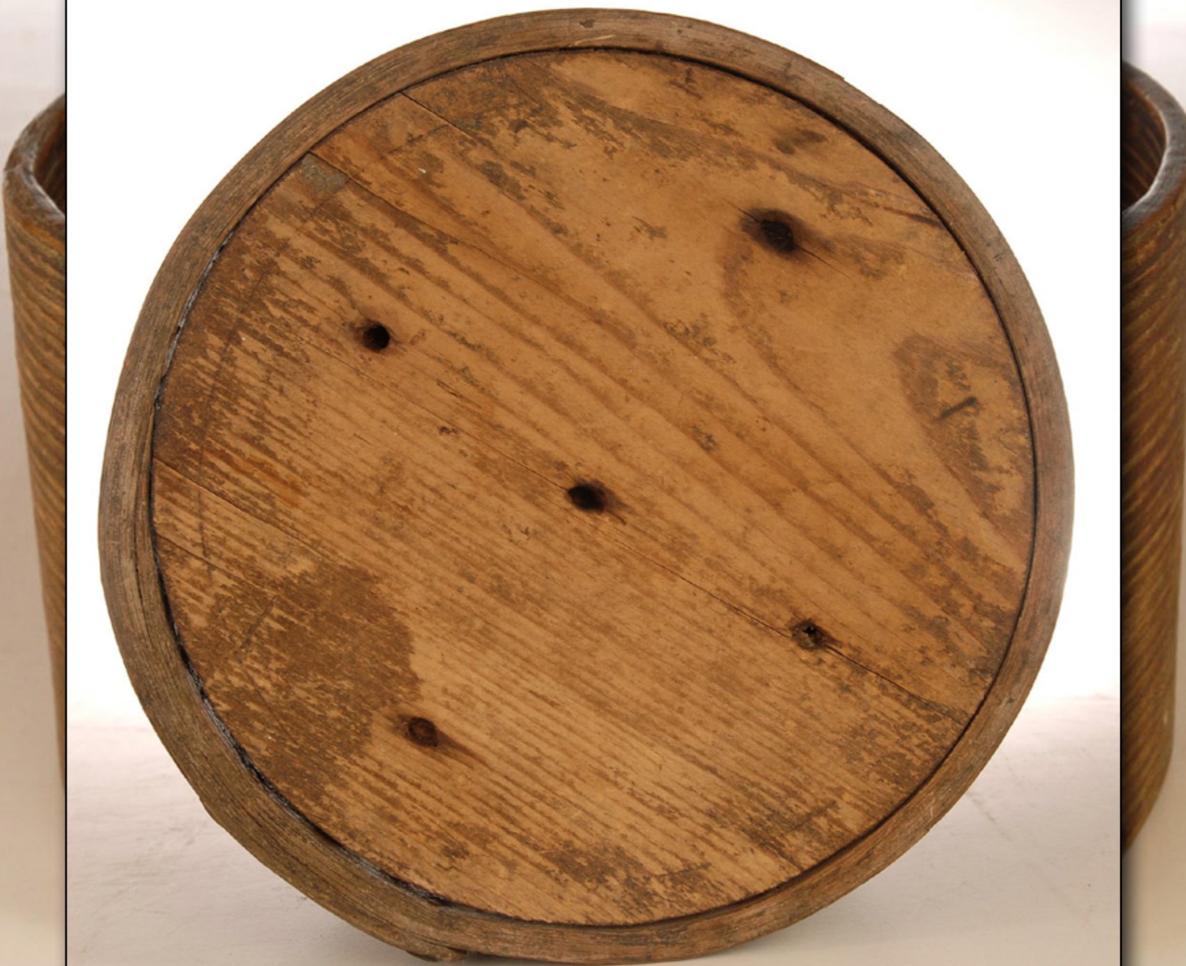
Chestnut Measure, Probably Connecticut or Rhode Island c. 1750 - 1800