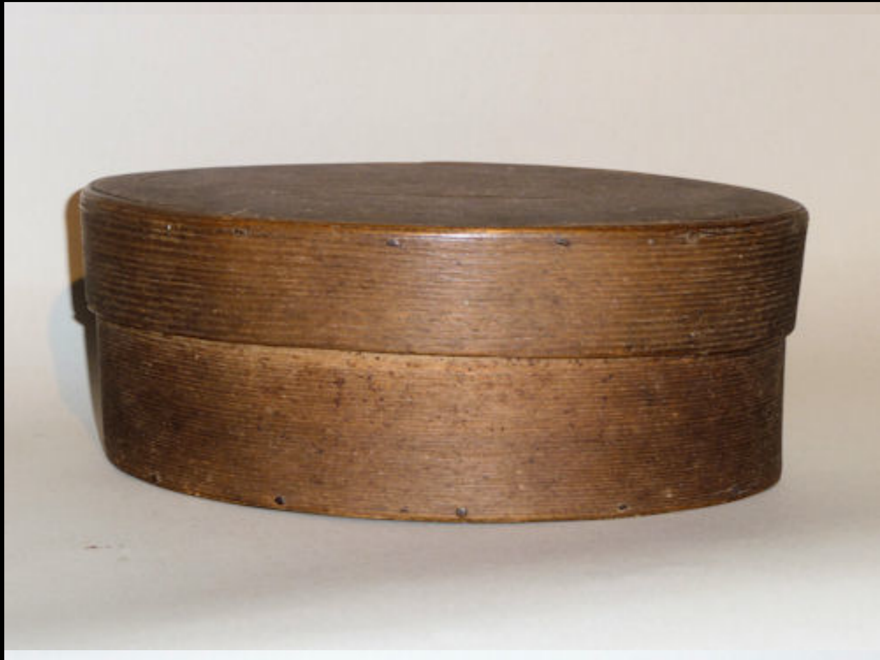
New England Pantry Oval Pantry Box 18th Century (Sharon Platt)