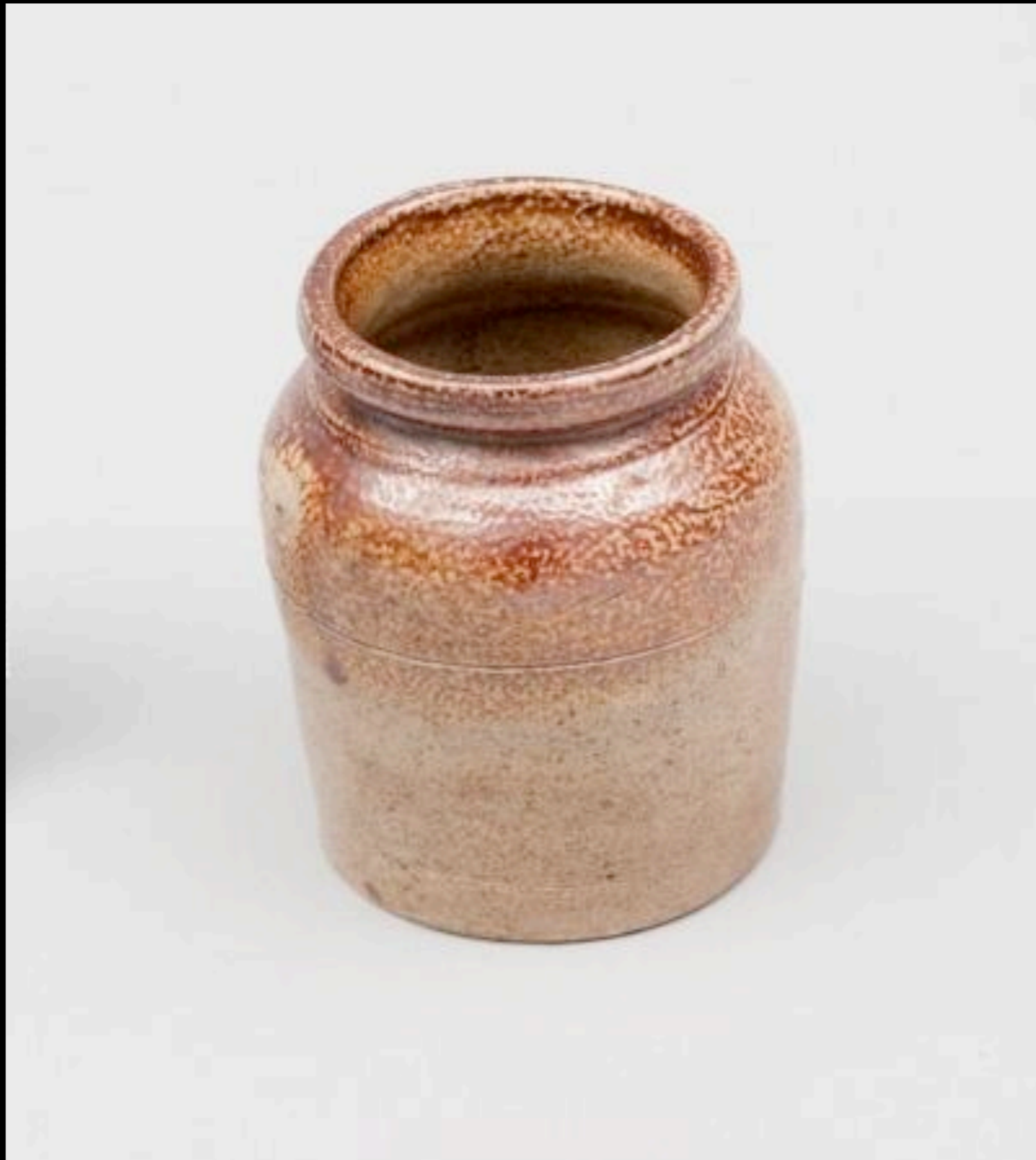
Brown Stoneware Storage Jar Excavated at Grand Portage, Minnesota 18th Century (Grand Portage, Minnesota, National Park Service)