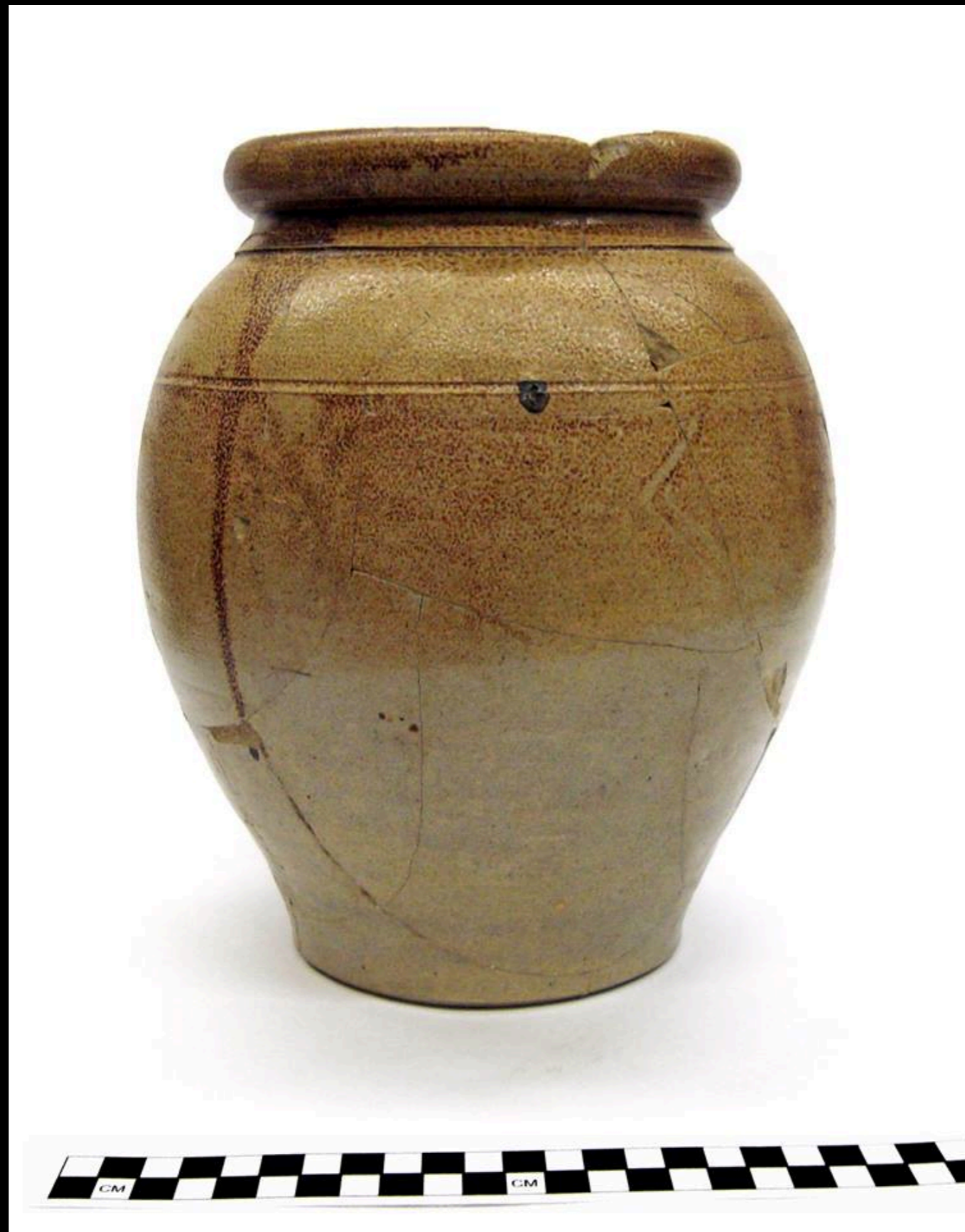
Brown Salt-glazed Stoneware Jar Excavated from Privy 3 at the Three Cranes Tavern, Charlestown, Massachusetts c. 1770