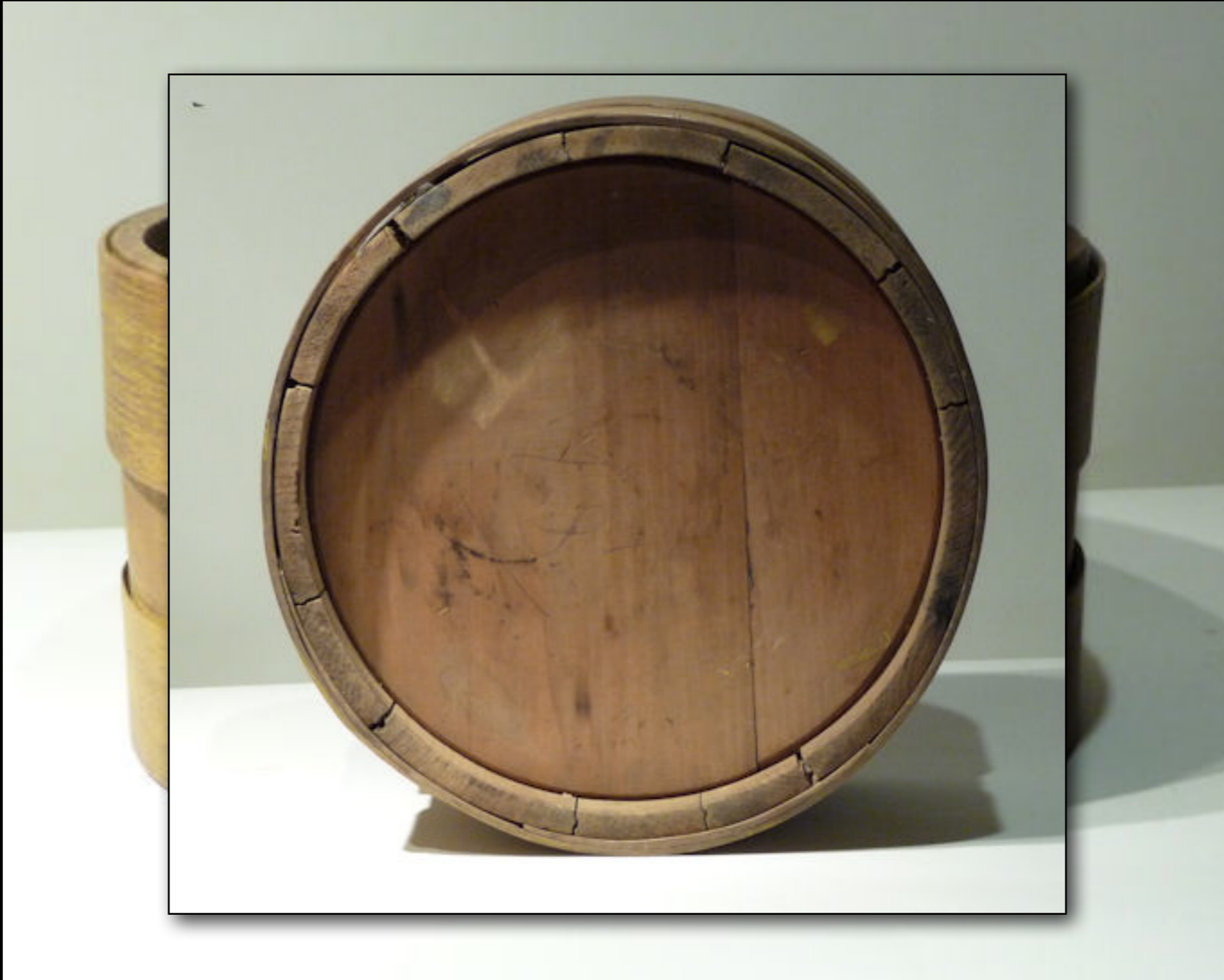
New England 12" Staved Tub with Traces of Yellow Paint 18th Century (Sharon Platt)