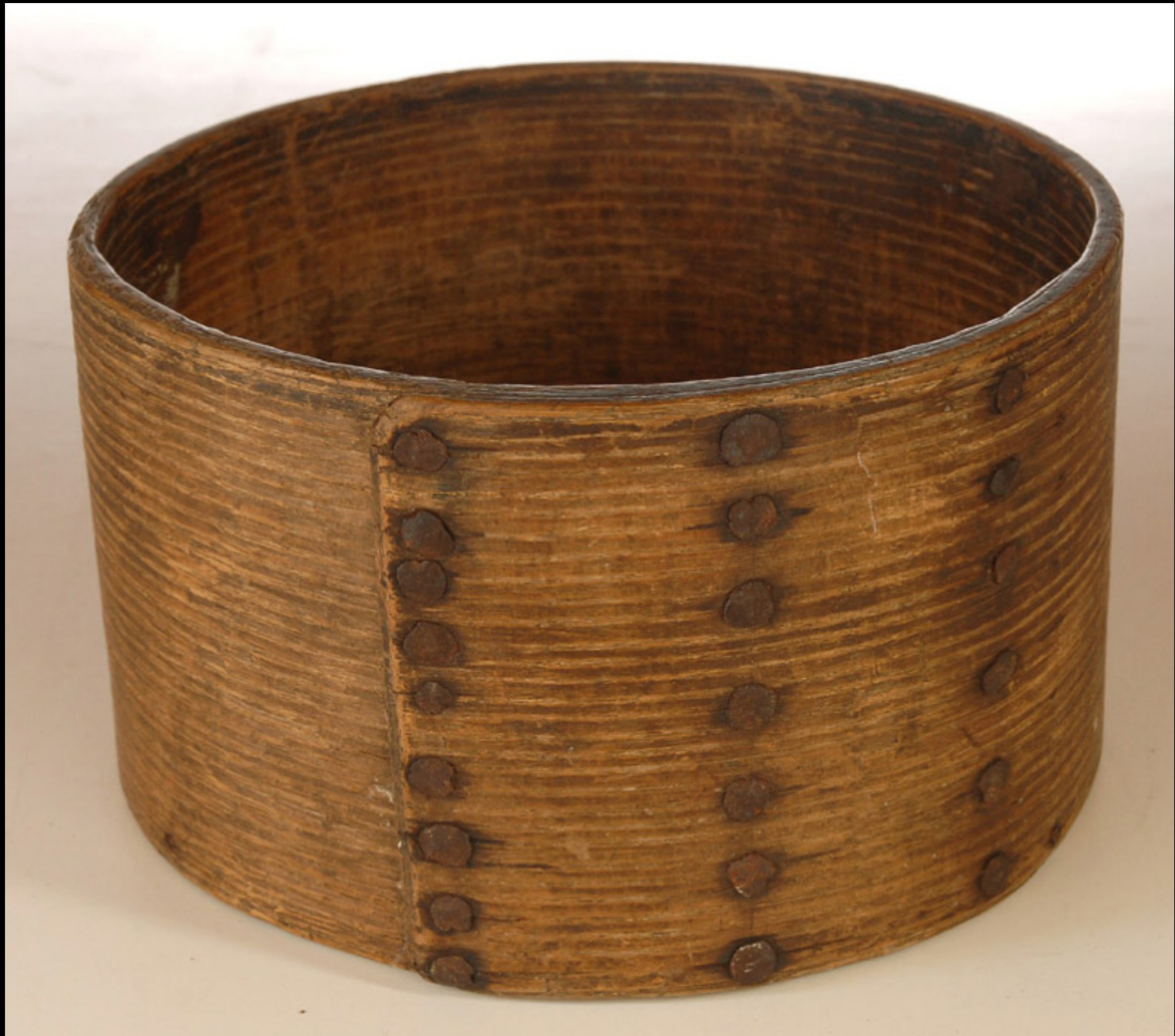
Chestnut Measure, Probably Connecticut or Rhode Island c. 1750 - 1800