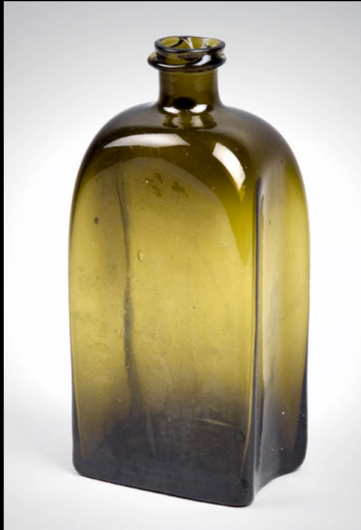
Glass Utility or Medicine Bottle European, 18th Century