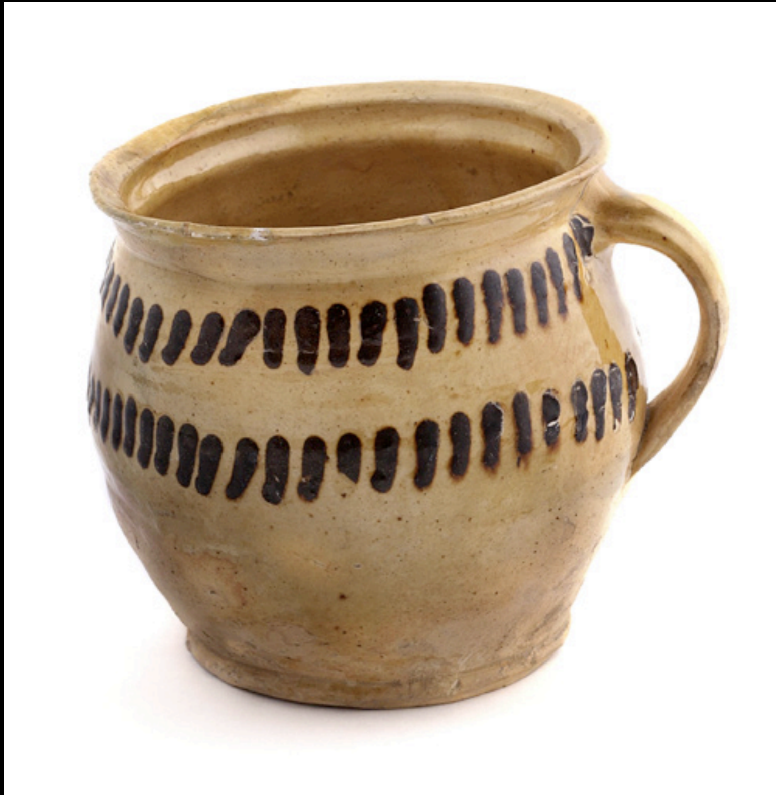
North Staffordshire Slip Decorated "Yellow Ware" "Jar" c. 1640 - 1650 (Stoke-On-Trent)