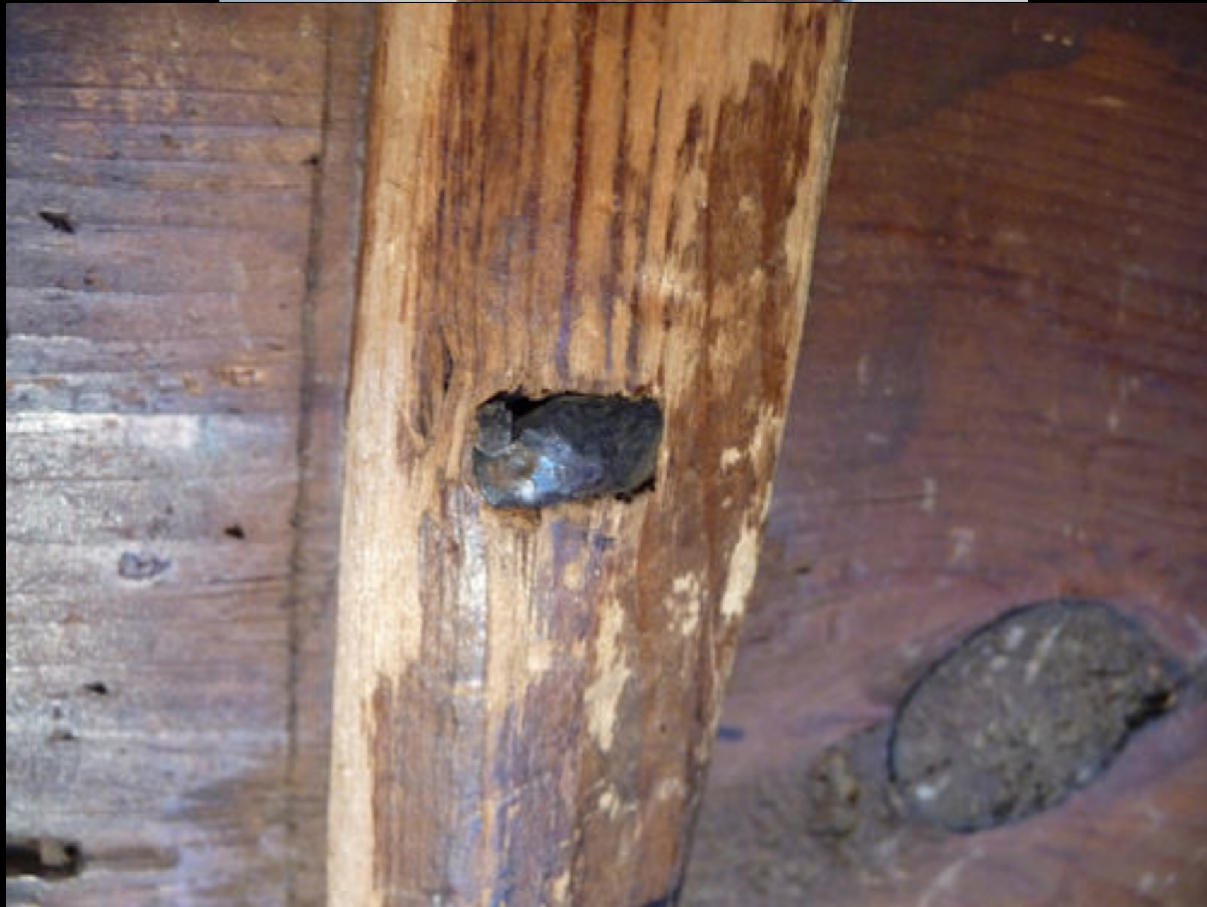
New England Pine Wood Storage Box 18th Century (Sharon Platt)