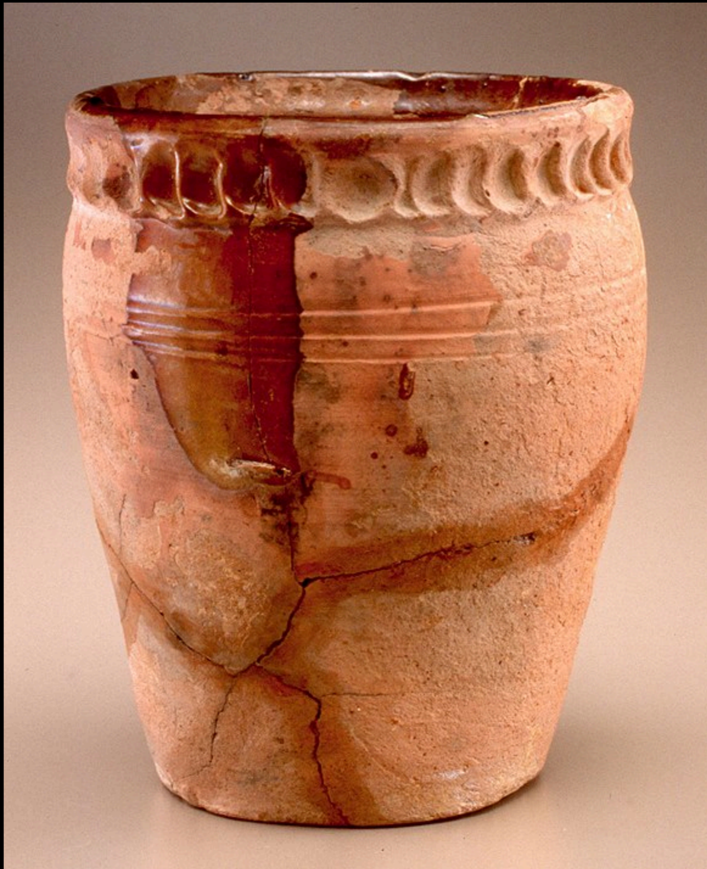
Storage Jar Made and Recovered in Jamestown, Virginia c. 1625 (Ceramics in America)