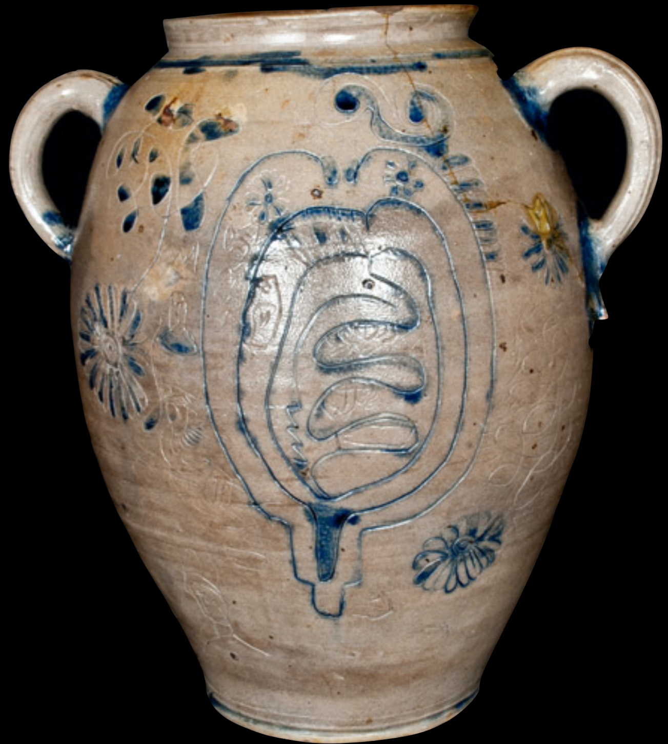
Stoneware Jar c. 1750

May be from the Kemple Pottery of Ringoes, NJ, the Morgan Pottery of Cheesequake, New Jersey or the Remmey or Crolius Potteries of Manhattan, New York (Crocker Farm Auction House)