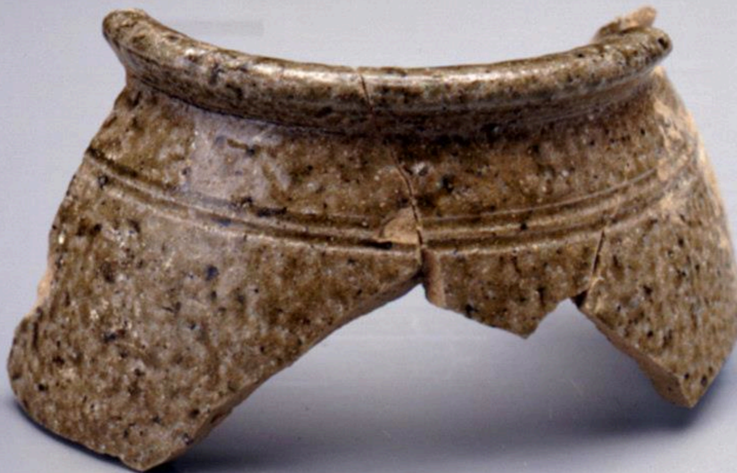
Brown Salt-glazed Stoneware Jar Shard Excavated at Yorktown, Virginia c. 1720 - 1740 (Ceramics in America)