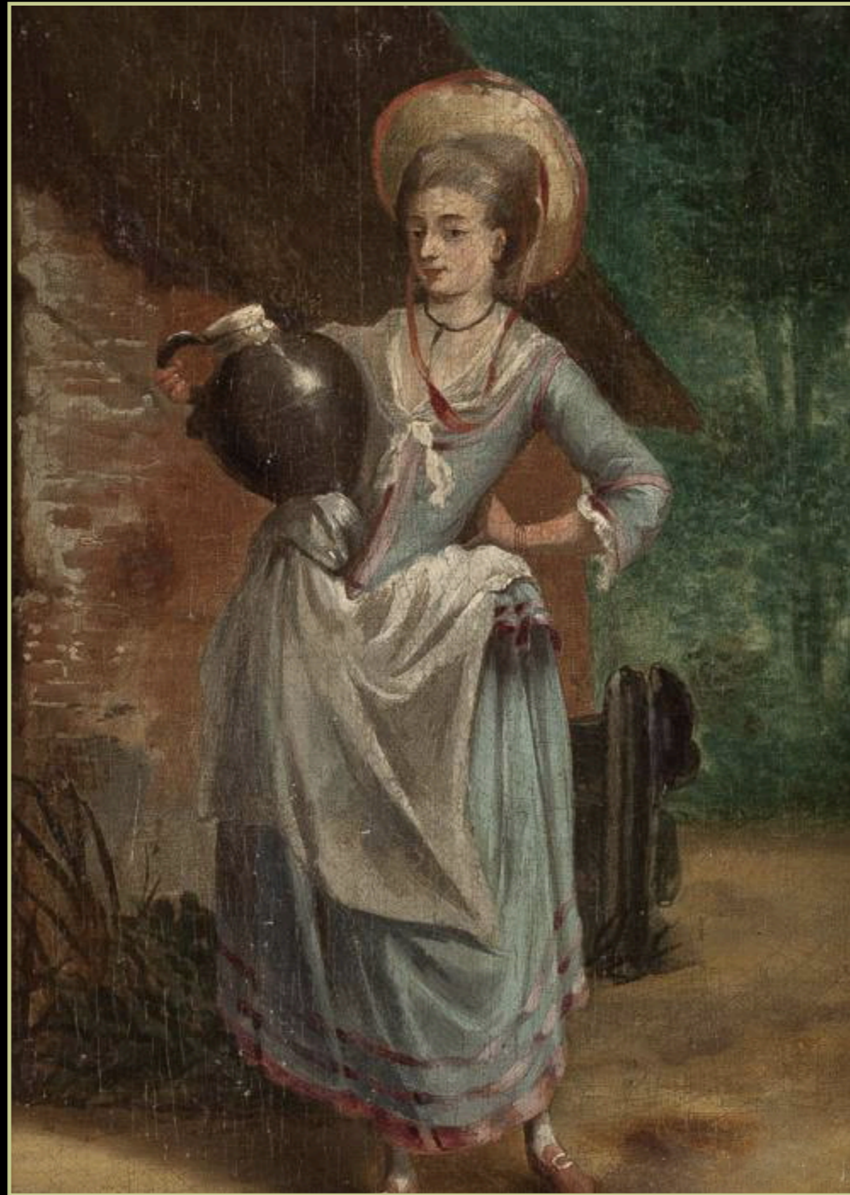
Madame Favart as a Waitress Note the Mouth of the Jug Tied Closed with a Bladder or Cloth