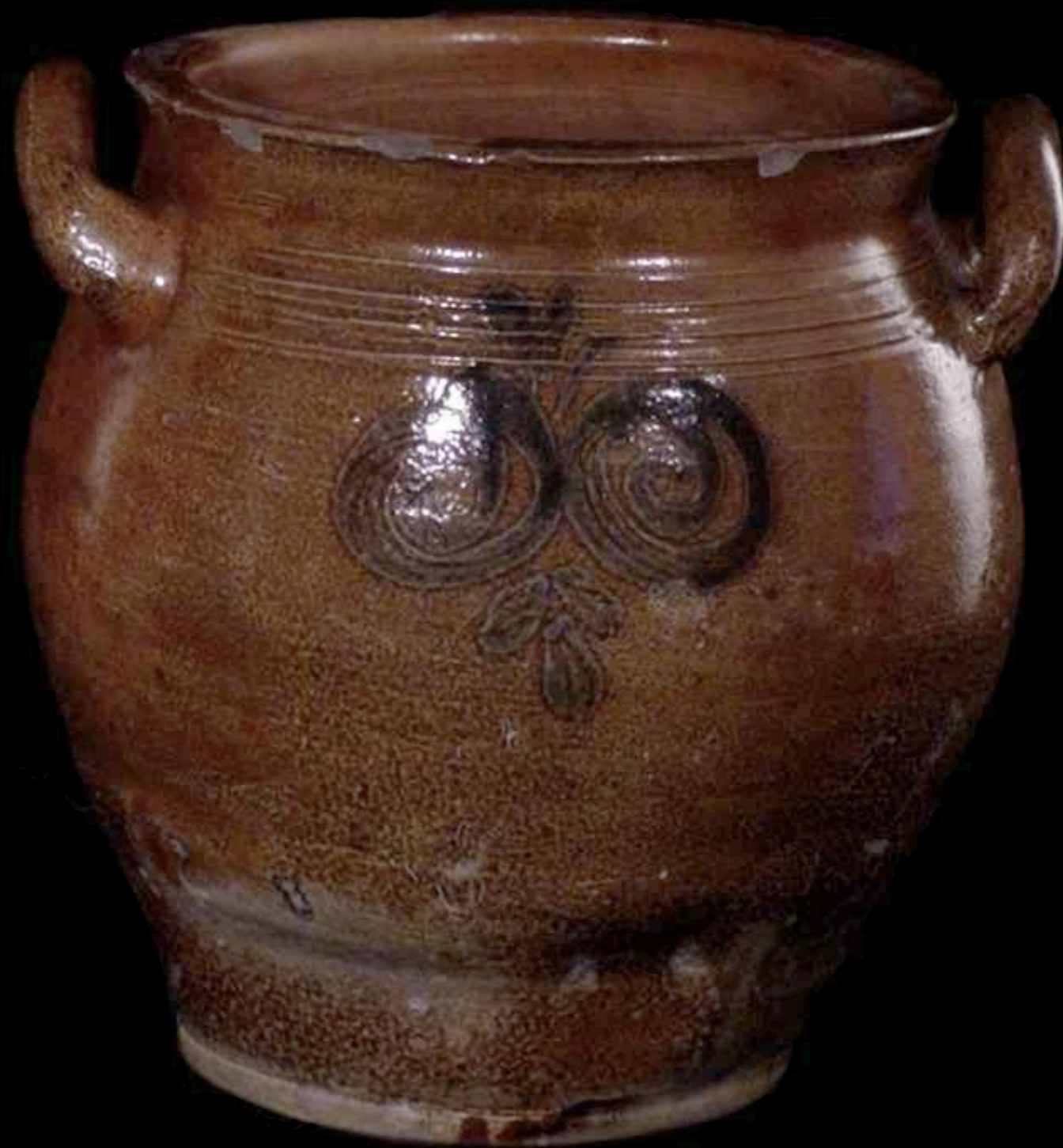
Cheesequake, New Jersey, Free Handled Pot with Watchspring Designs c. 1775 (Early American Stoneware)