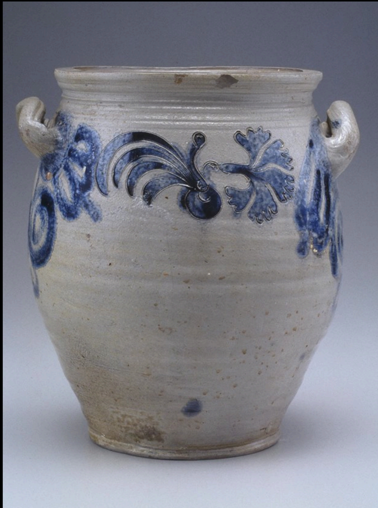
New Jersey Stoneware Jar with Watch Spring & Incised Cobalt Decorations 18th Century (Ceramics in America)