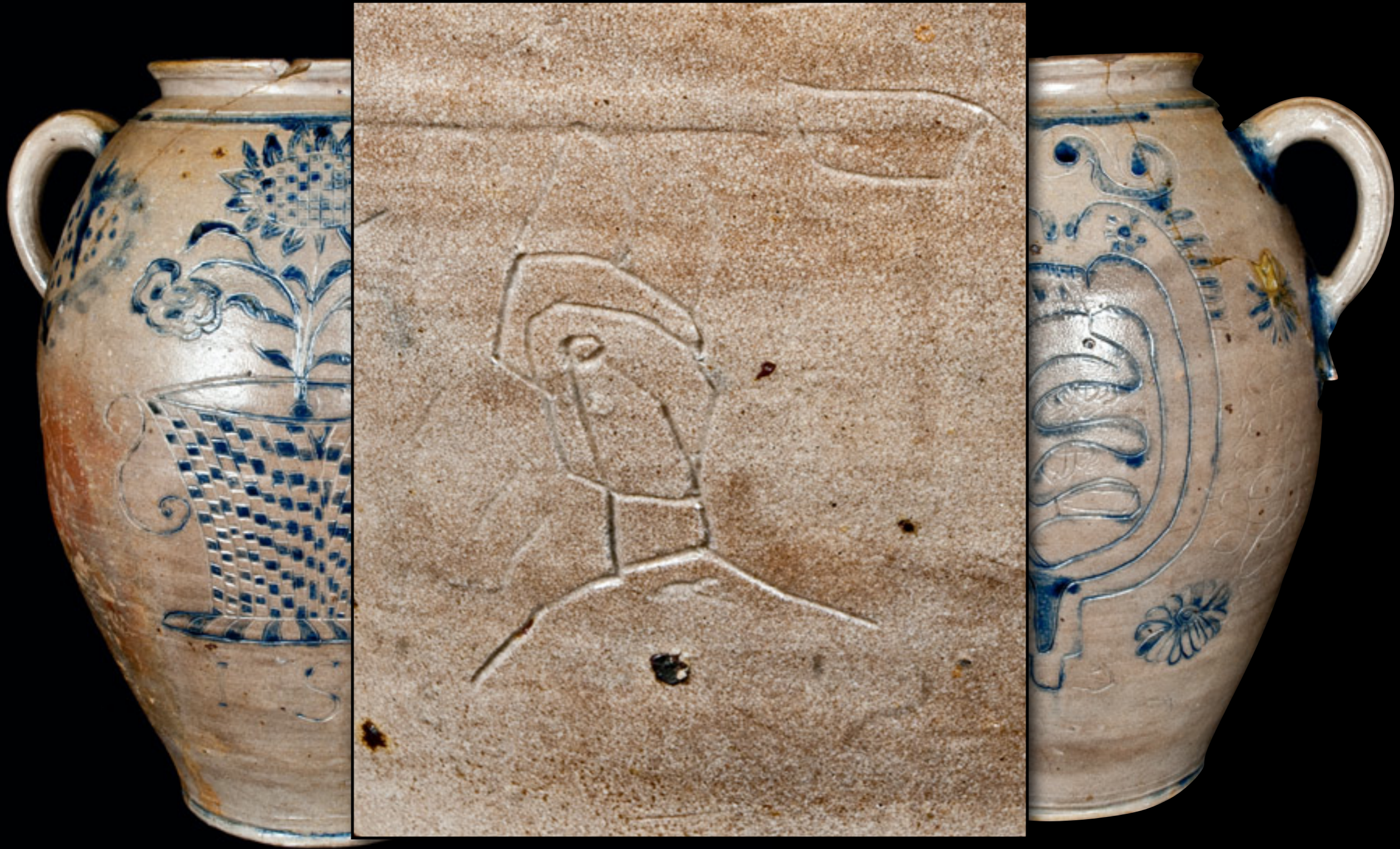
Stoneware Jar c. 1750 May be from the Kemple Pottery of Ringoes, NJ, the Morgan Pottery of Cheesequake, NJ or the Remmey or Crolius Potteries of Manhattan, New York