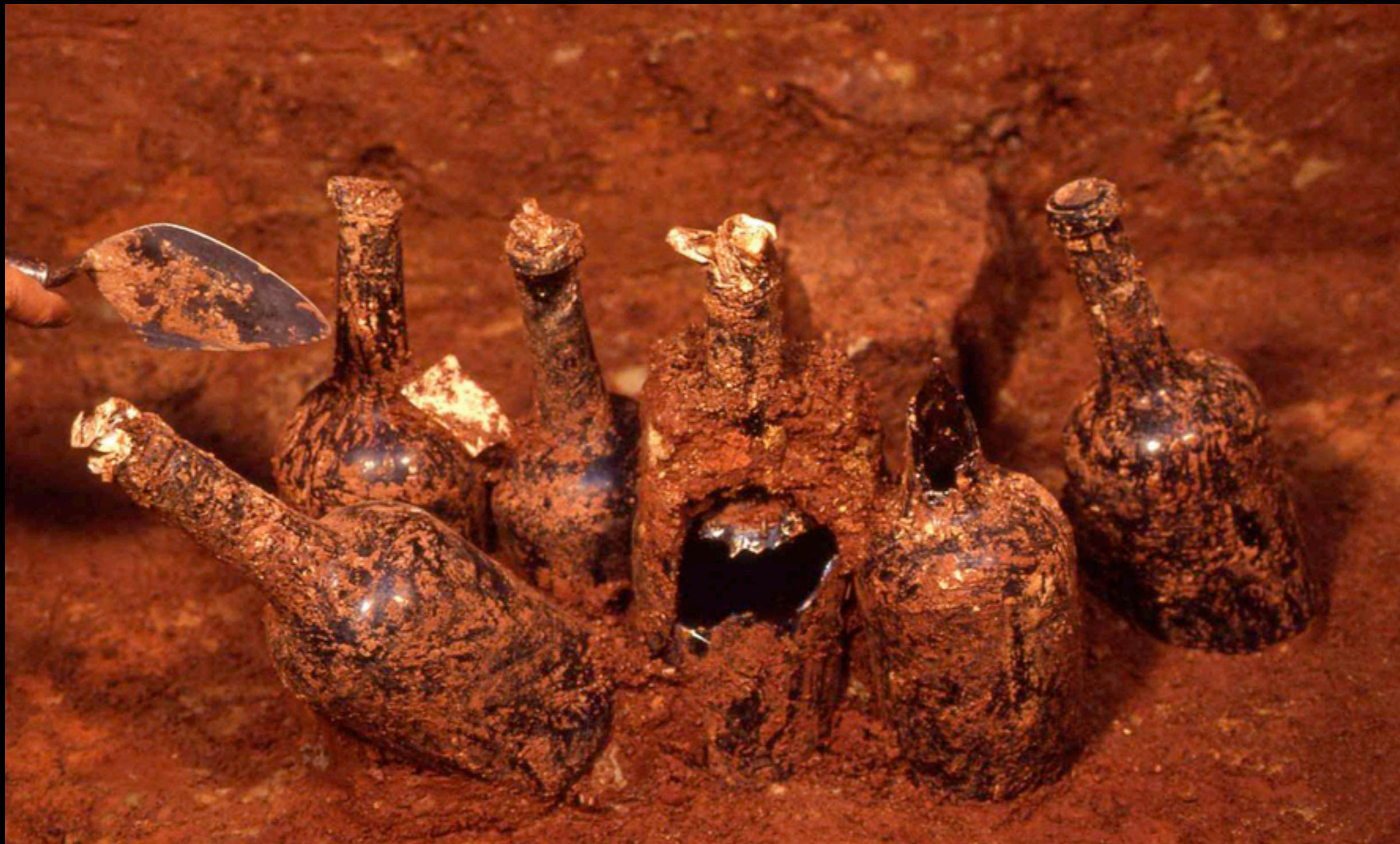
English Dark Green Bottles Recovered from the Dry Well at Monticello, Virginia, c. 1760 - 1775 When Found, they Contained Small Whole Cherries, Grapes, and Cranberries (Colonial Williamsburg Archeology Series)