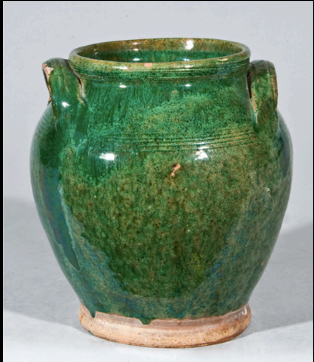
Bristol County, Massachusetts, Green Glaze Redware Jar Late 18th - Early 19th Century (Crocker Farm Auction House)