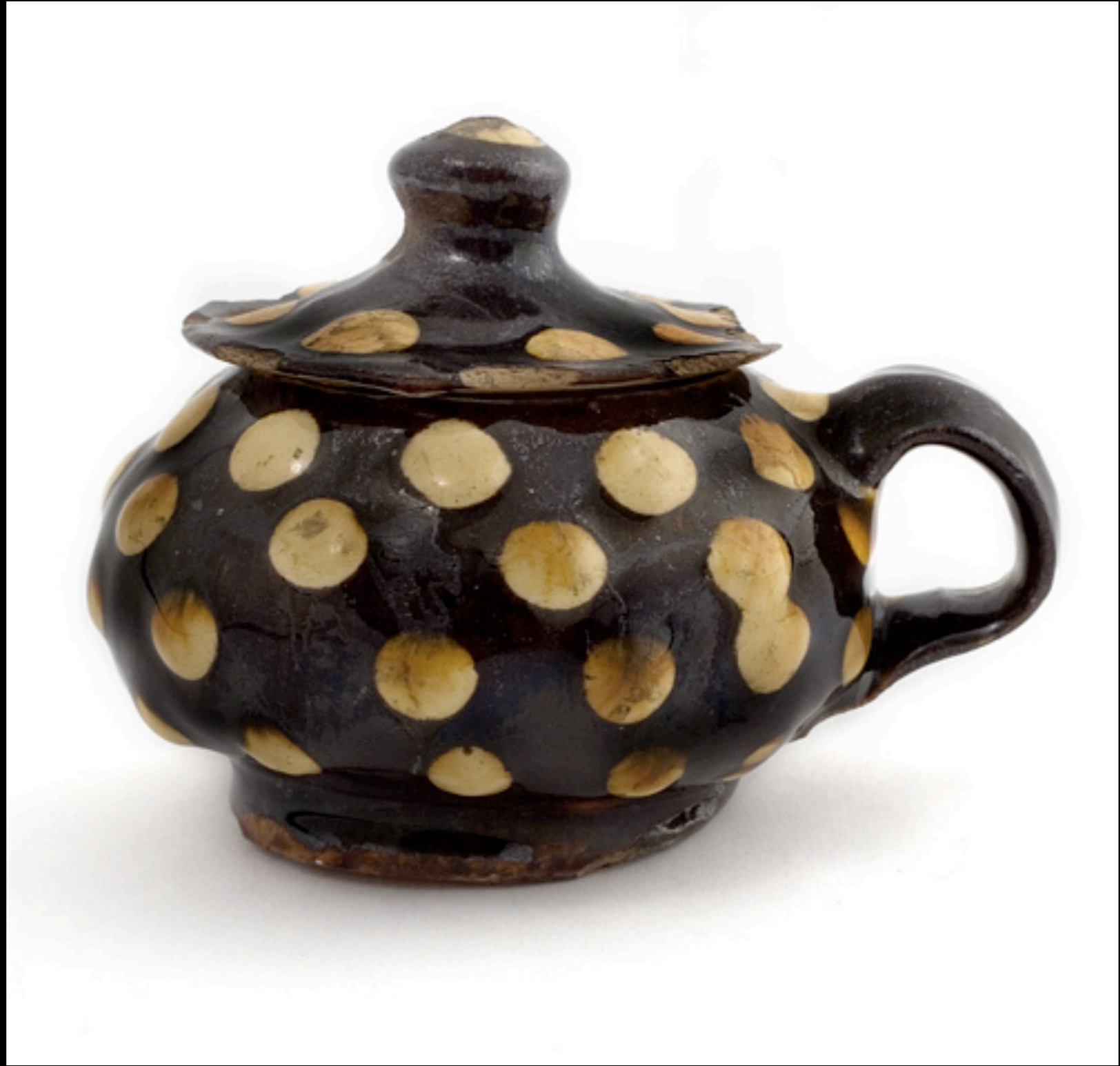
Staffordshire Slip Decorated "Jar" Late 17th or Early 18th Century (Stoke-On-Trent)