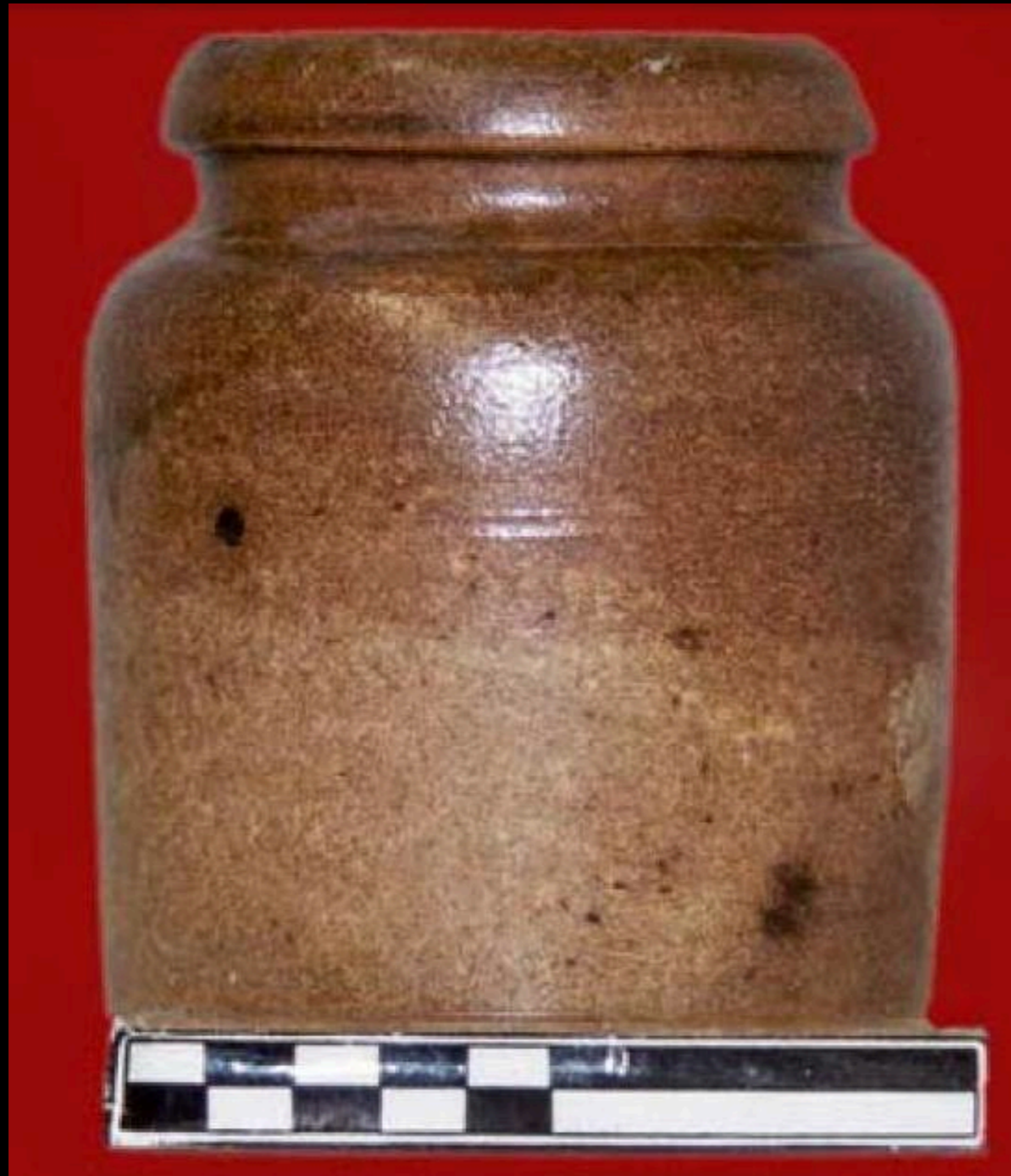
Brown Saltglaze Stone Jar Excavated from the British Barracks, City Hall Park, New York City (From: "The History and Archeology of City Hall Park")