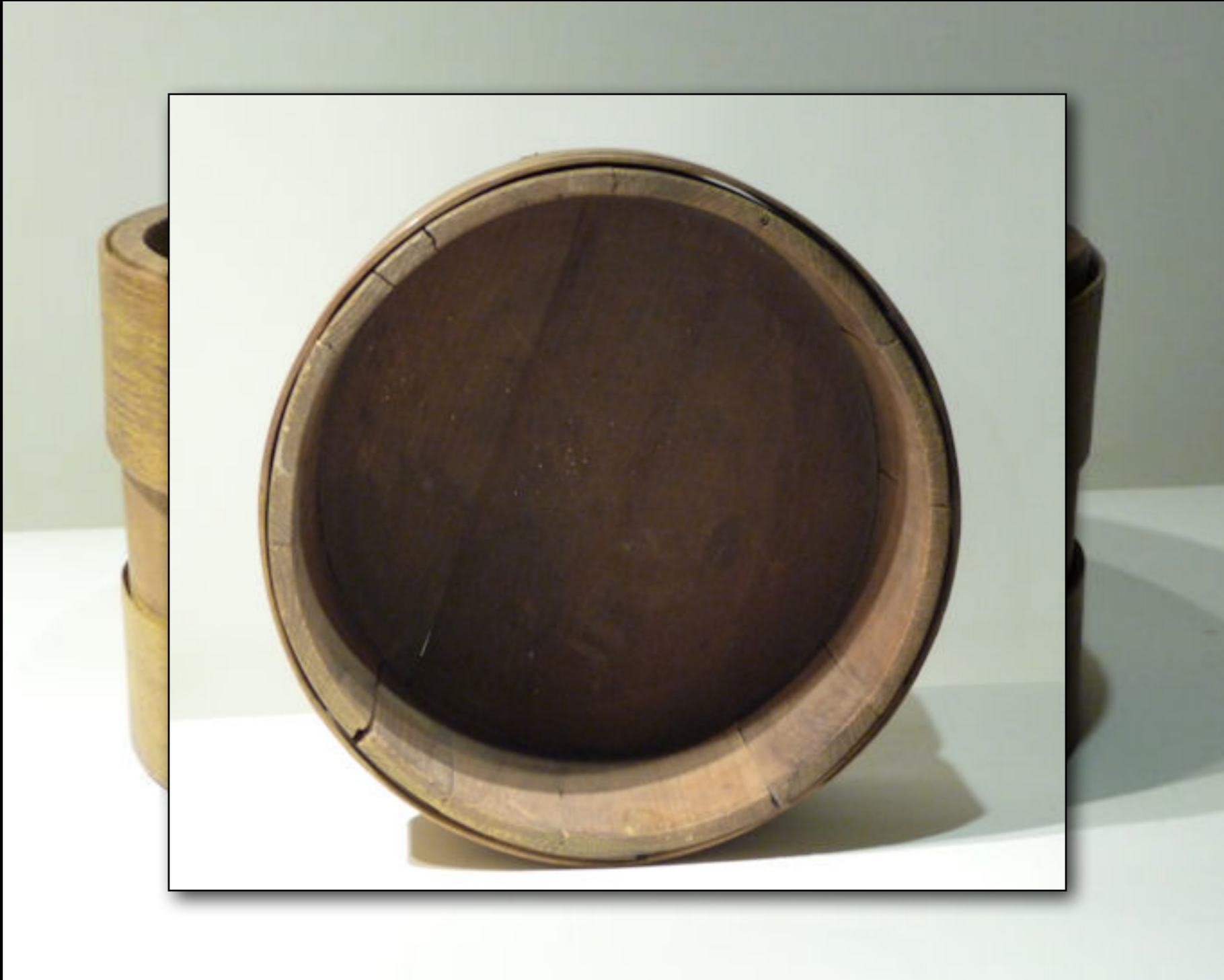
New England 12" Staved Tub with Traces of Yellow Paint 18th Century (Sharon Platt)