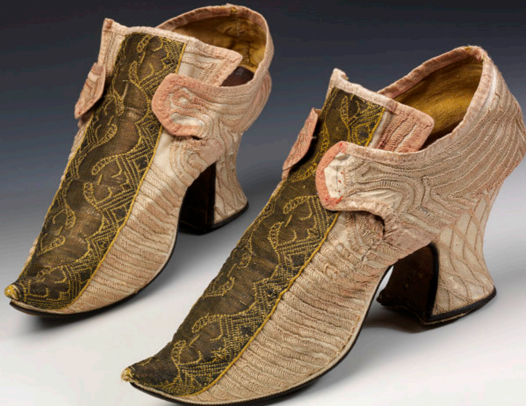
English Leather & Silk Tie Shoes