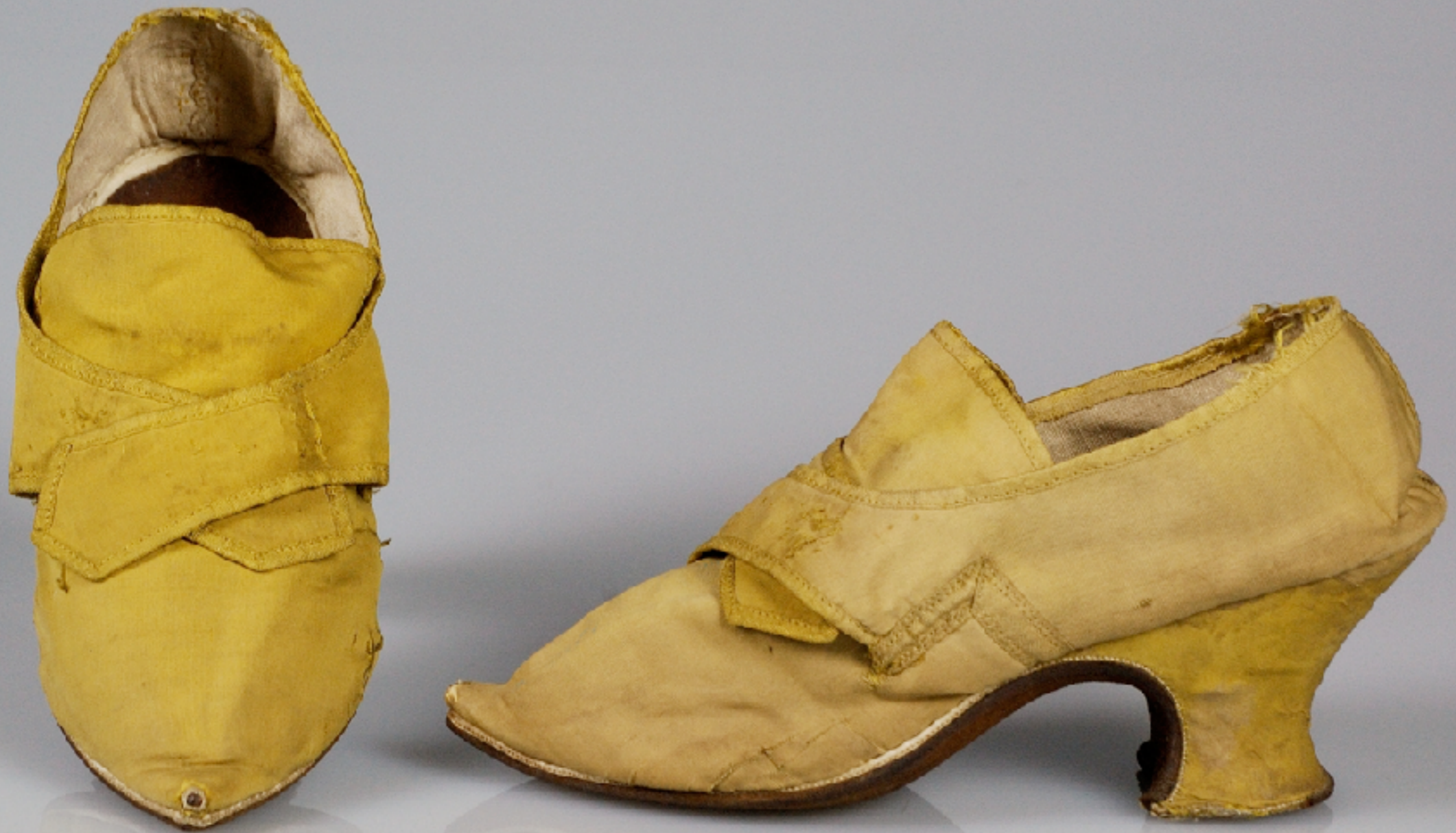
European Silk Buckle Shoes c. 1730 - 1759 (Metropolitan Museum of Art)