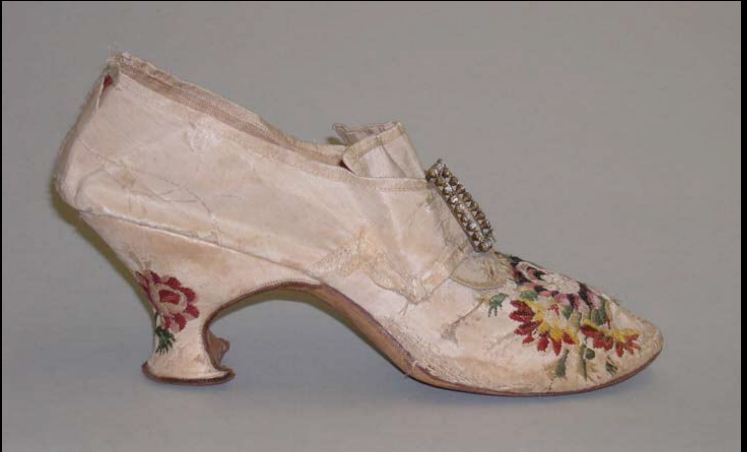
English Silk Shoe with Paste Buckle c. 1780 (Metropolitan Museum of Art)