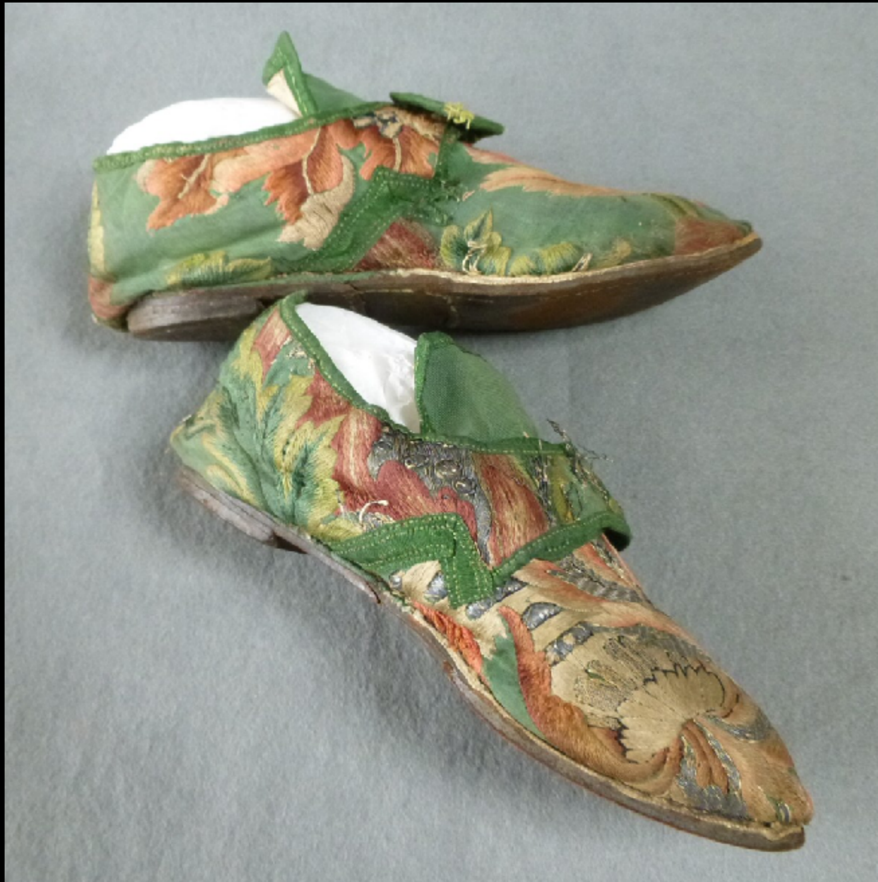
Flat Heeled Silk Buckle Shoes, Likely Made for an Older Woman