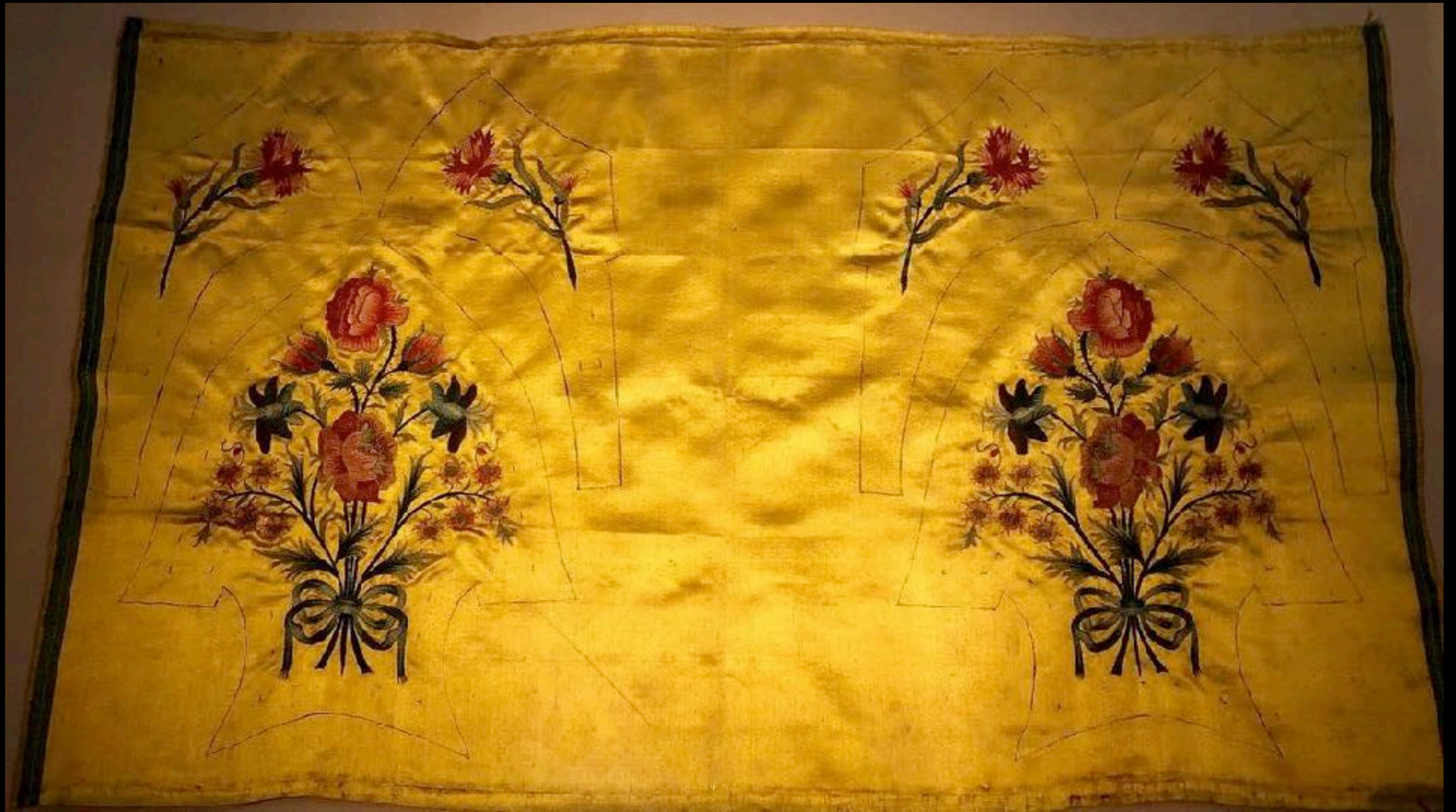
Uncut Embroidered Silk Fabric Made for Buckle Shoes Mid 18th Century