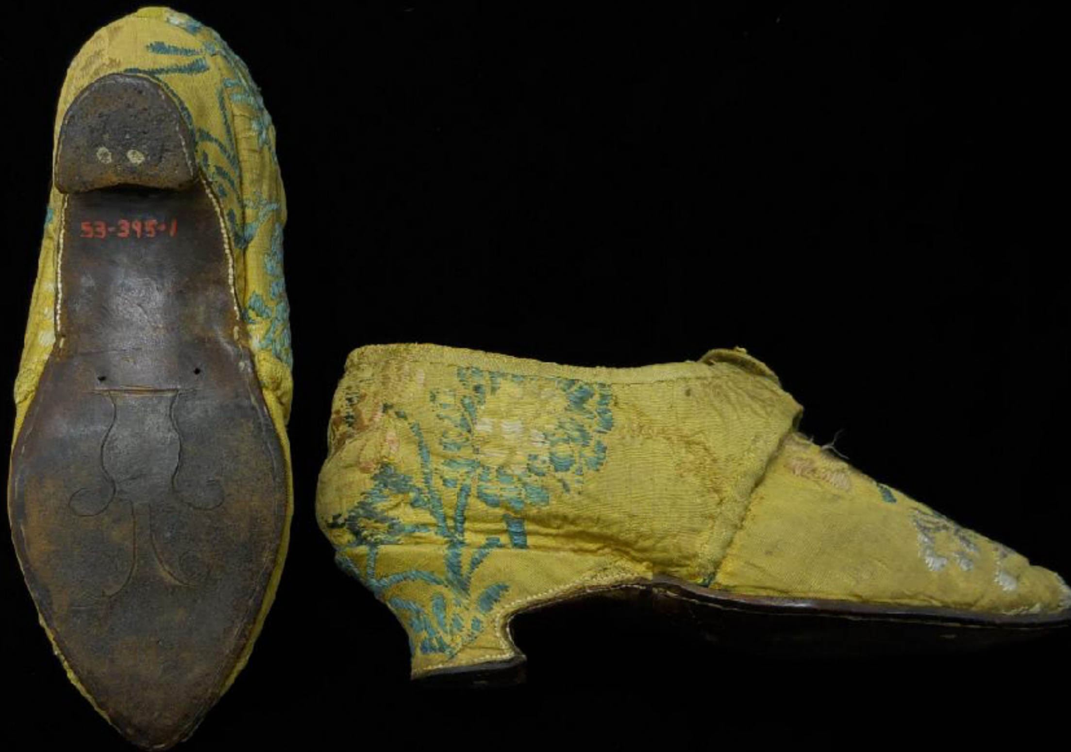
German or Dutch Brocaded Silk Buckle Shoes c. 1770 (Colonial Williamsburg Foundation)