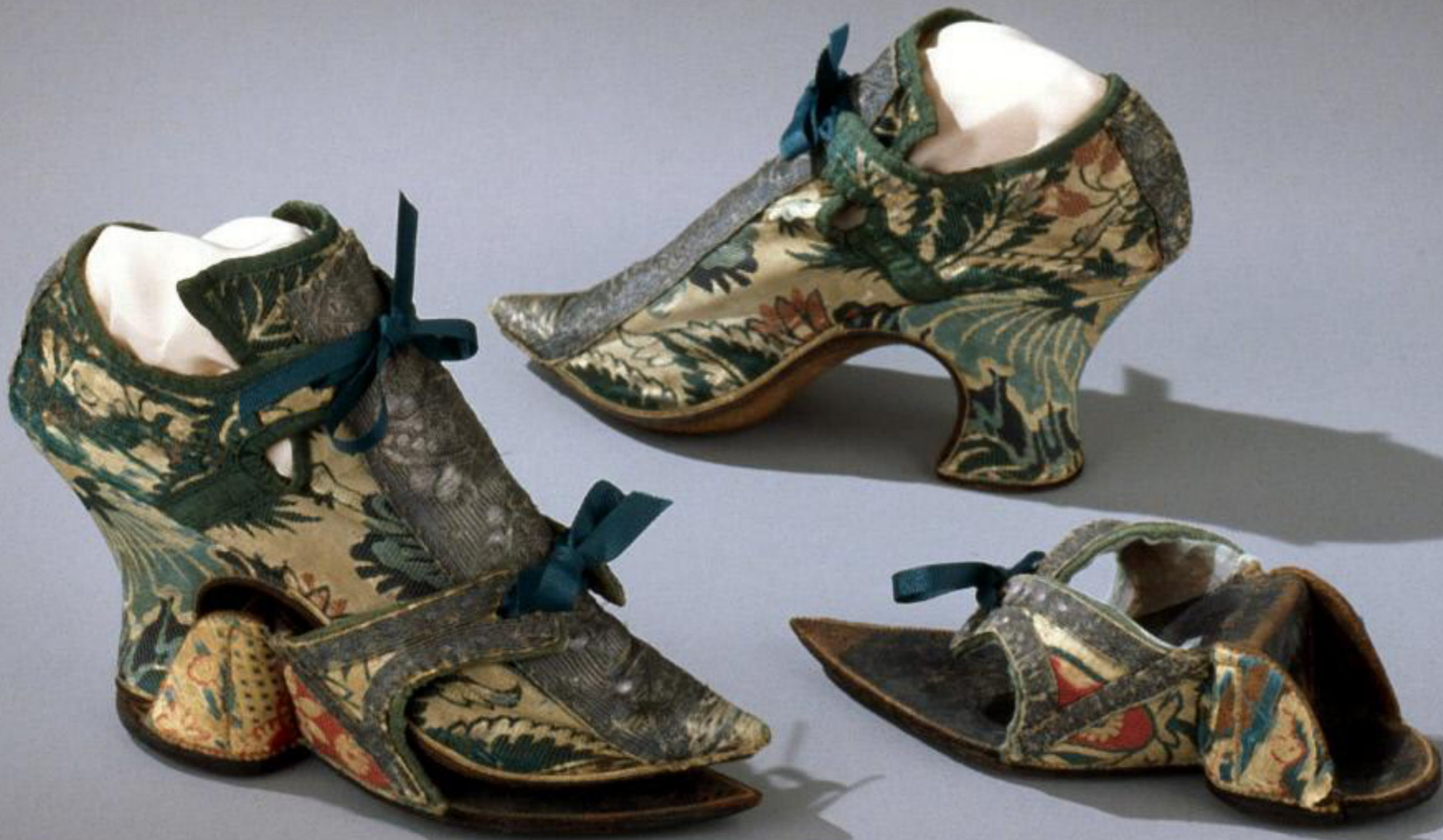
English Brocaded Silk Tie Shoes with Pattens c. 1730 - 1740 (Colonial Williamsburg Foundation)