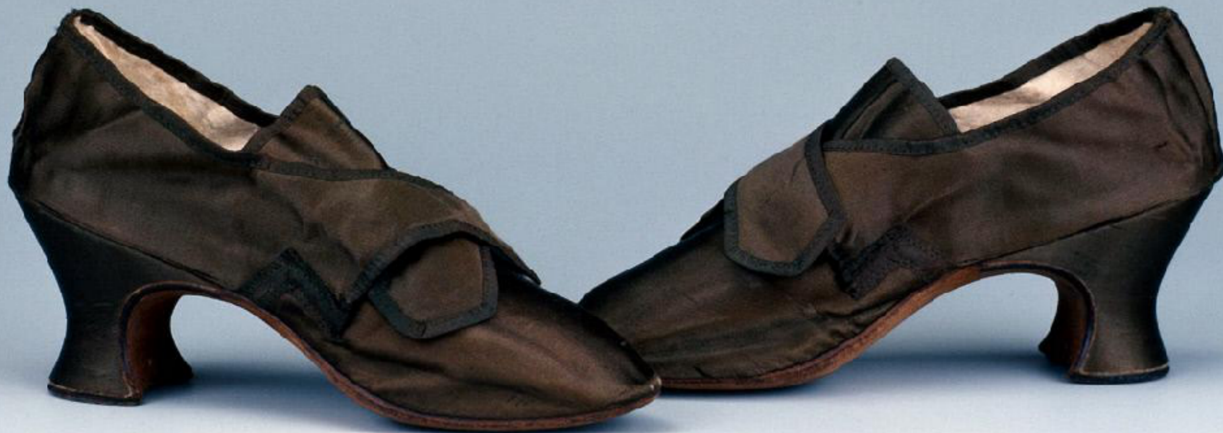
English Green Satin Buckle Shoes by Gresham c. 1770 (Colonial Williamsburg Foundation)