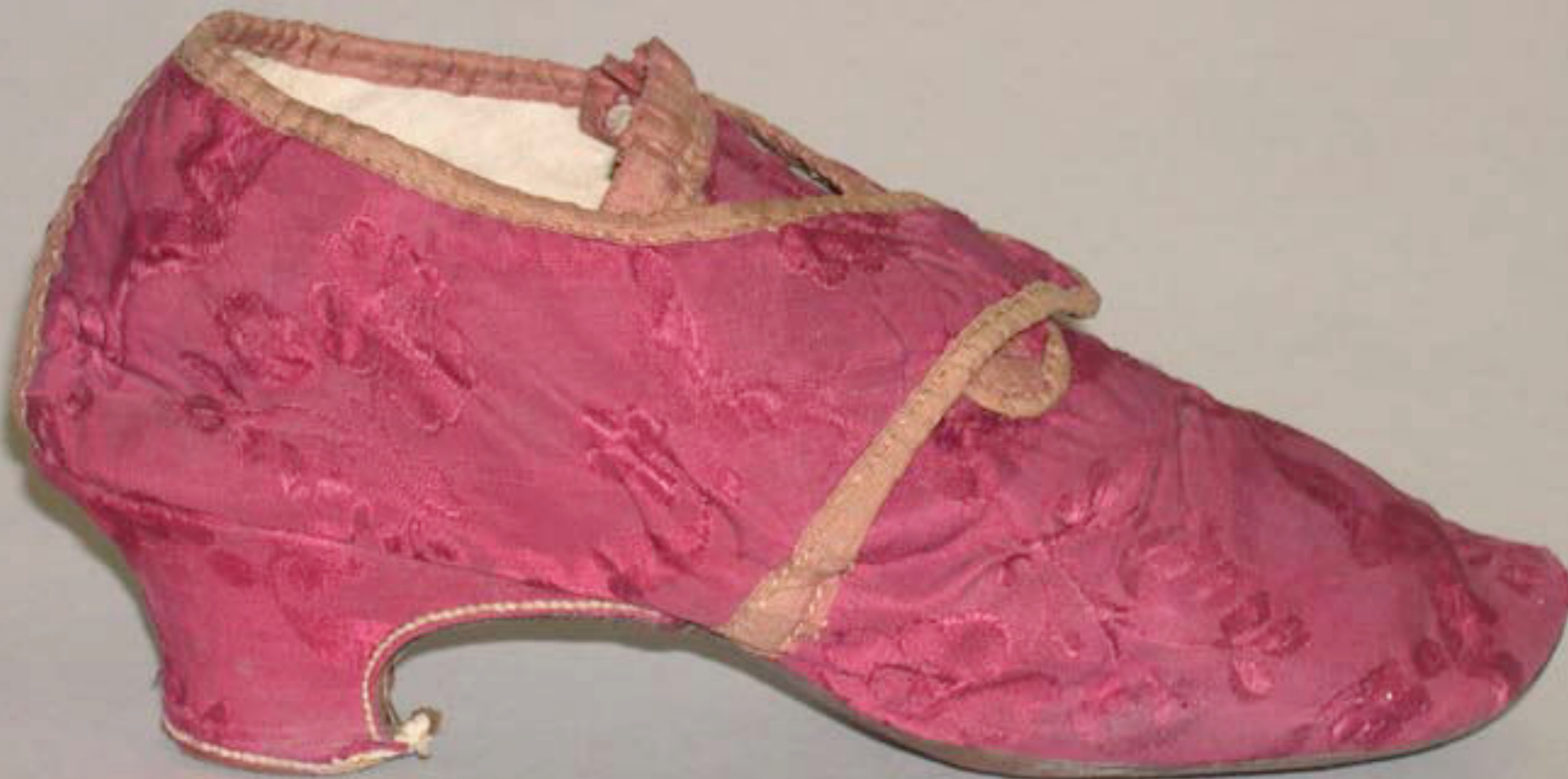
Italian Silk Buckle Shoe c. 1770 - 1780 (Metropolitan Museum of Art)