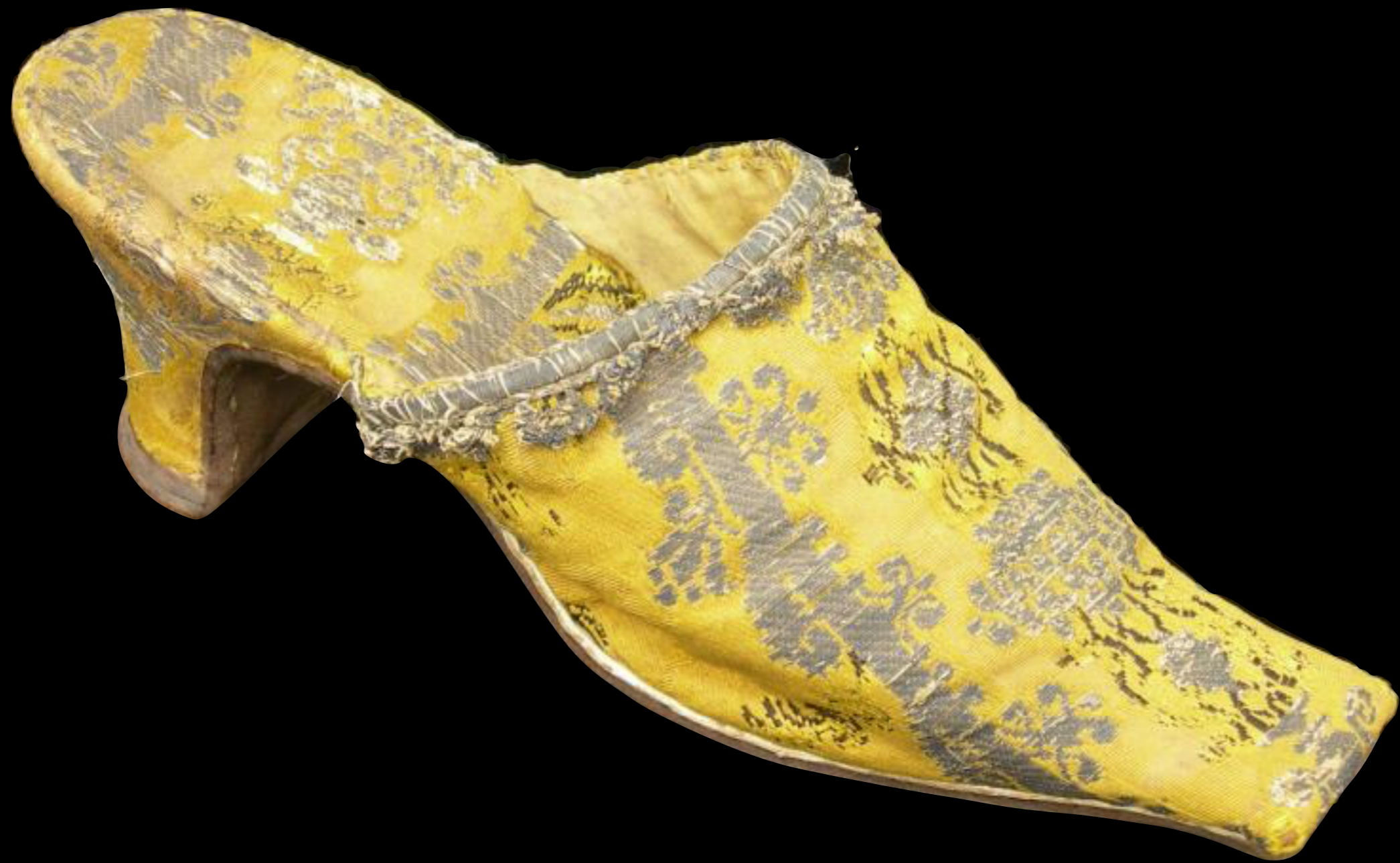
English Brocaded Silk Mule or Backless Slipper