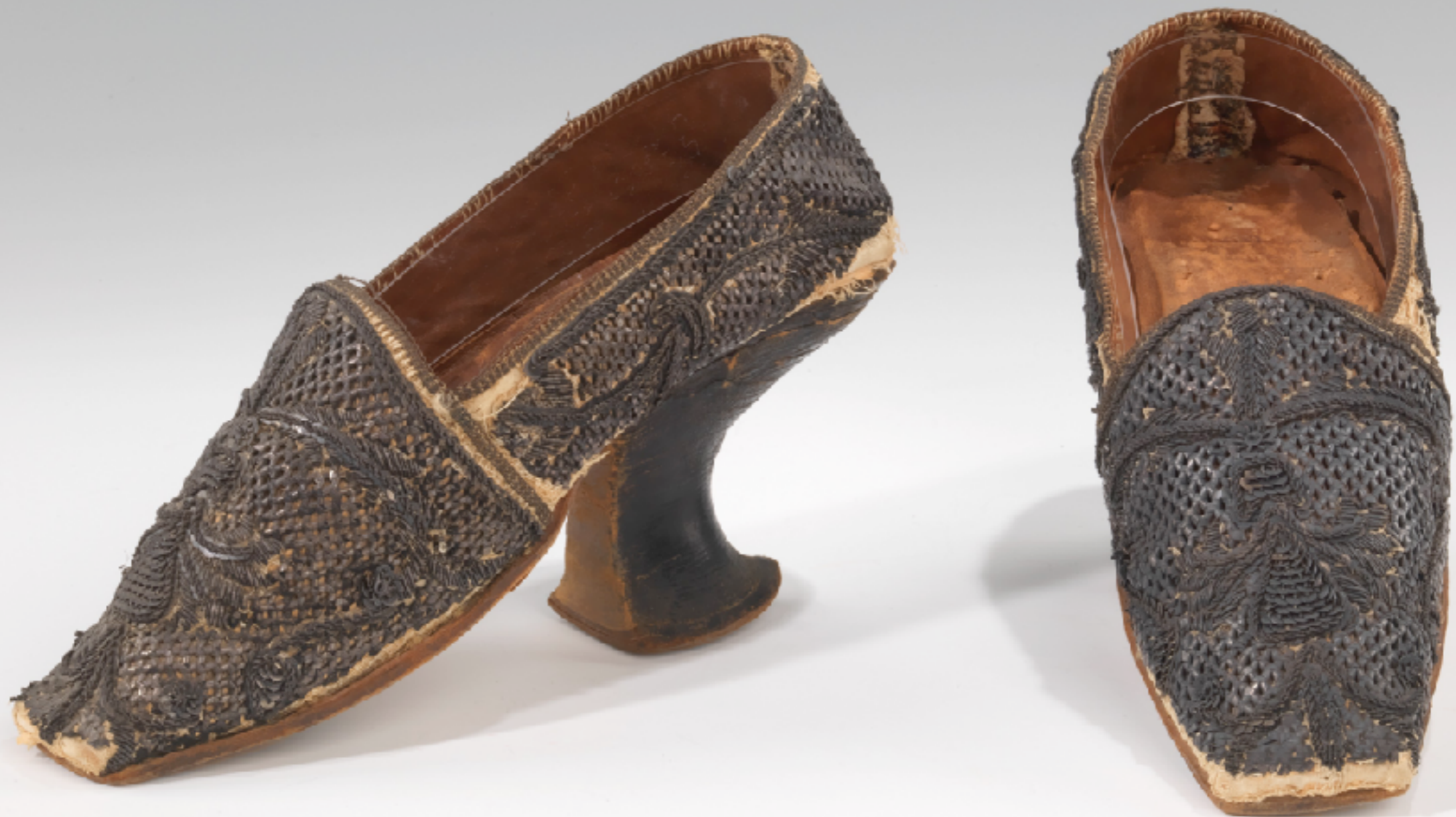
European Slipper Shoes c. 1720 - 1750 (Museum of Fine Arts, Boston)