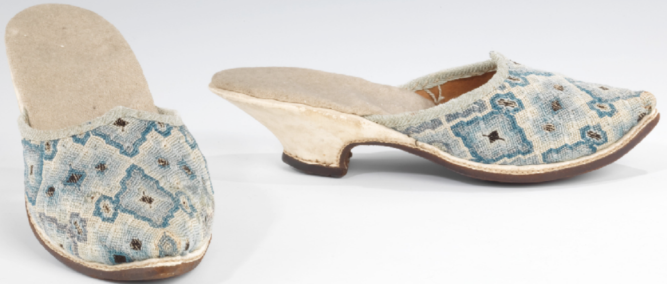
European Mules or Backless Slippers Early 18th Century (Metropolitan Museum of Art)