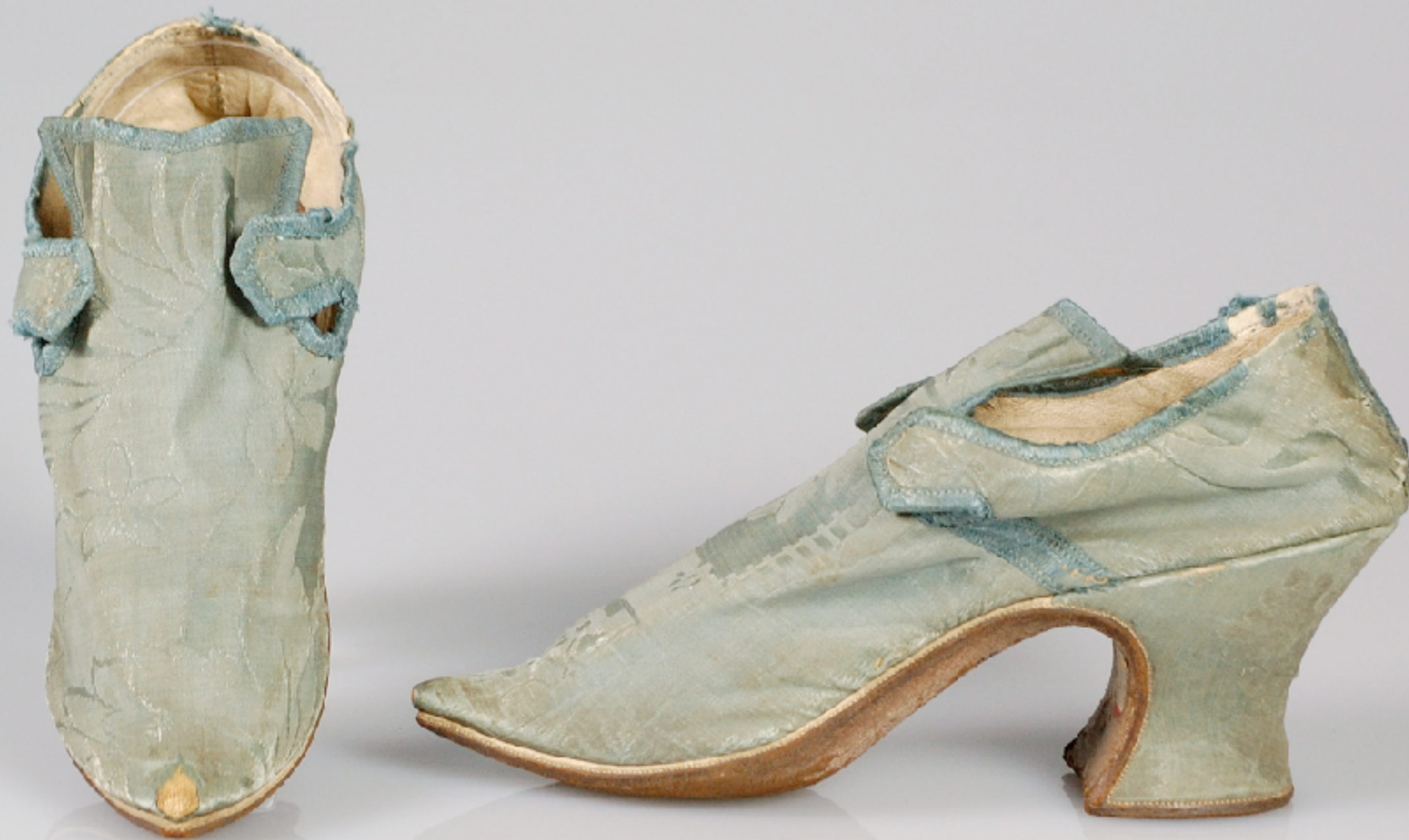
European Silk Buckle Shoes c. 1690 - 1710 (Metropolitan Museum of Art)