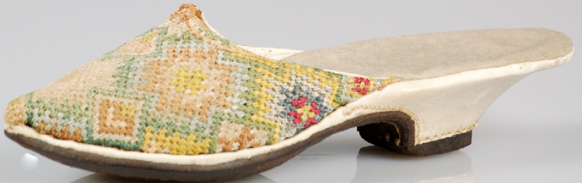
European Mule or Backless Slipper Early 18th Century (Metropolitan Museum of Art)