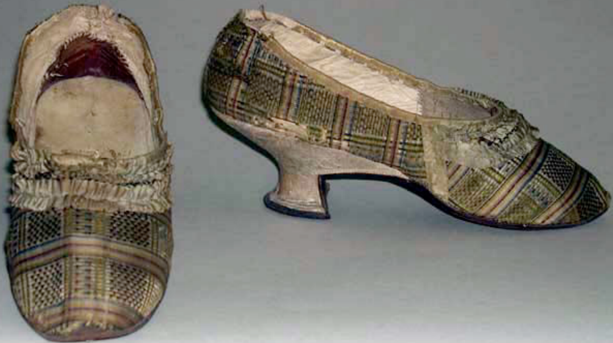
American (or European) Slipper Shoe c. 1780 (Metropolitan Museum of Art)