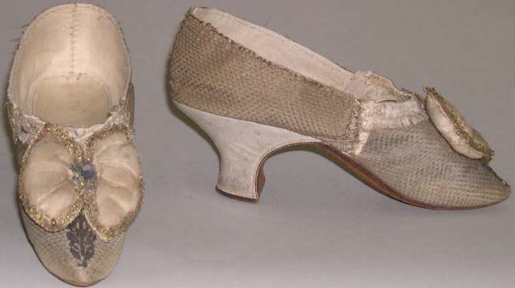
English Silk Shoes c. 1770 - 1789 (Metropolitan Museum of Art)