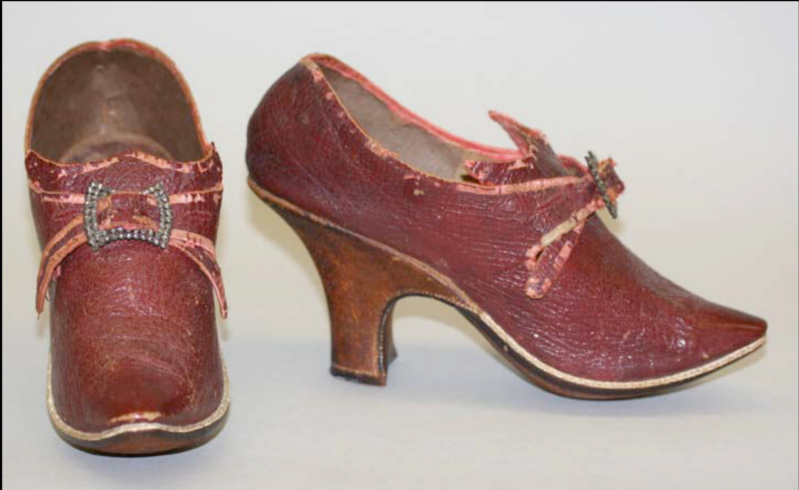
French Leather Buckle Shoes 18th Century (Metropolitan Museum of Art)