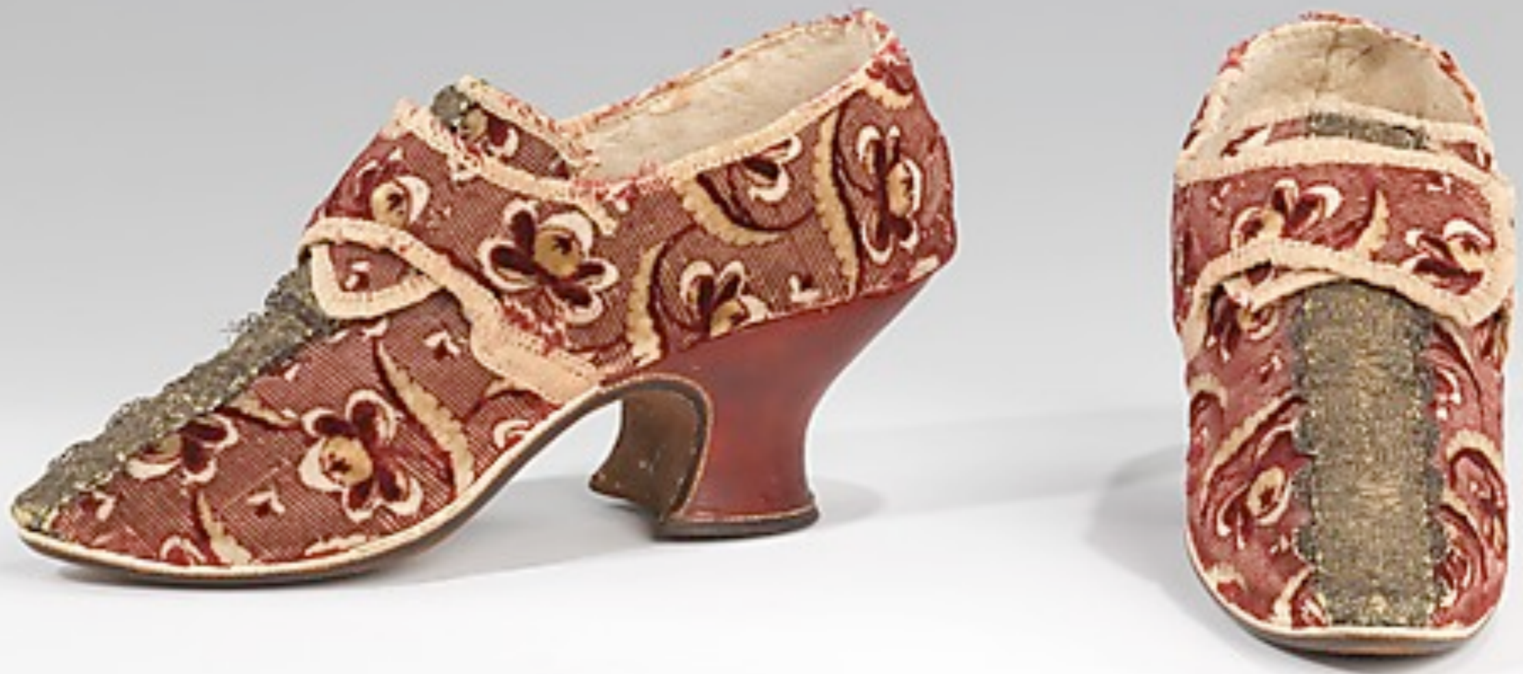
English Silk & Metal Buckle Shoes c. 1732 - 1759 (Metropolitan Museum of Art)