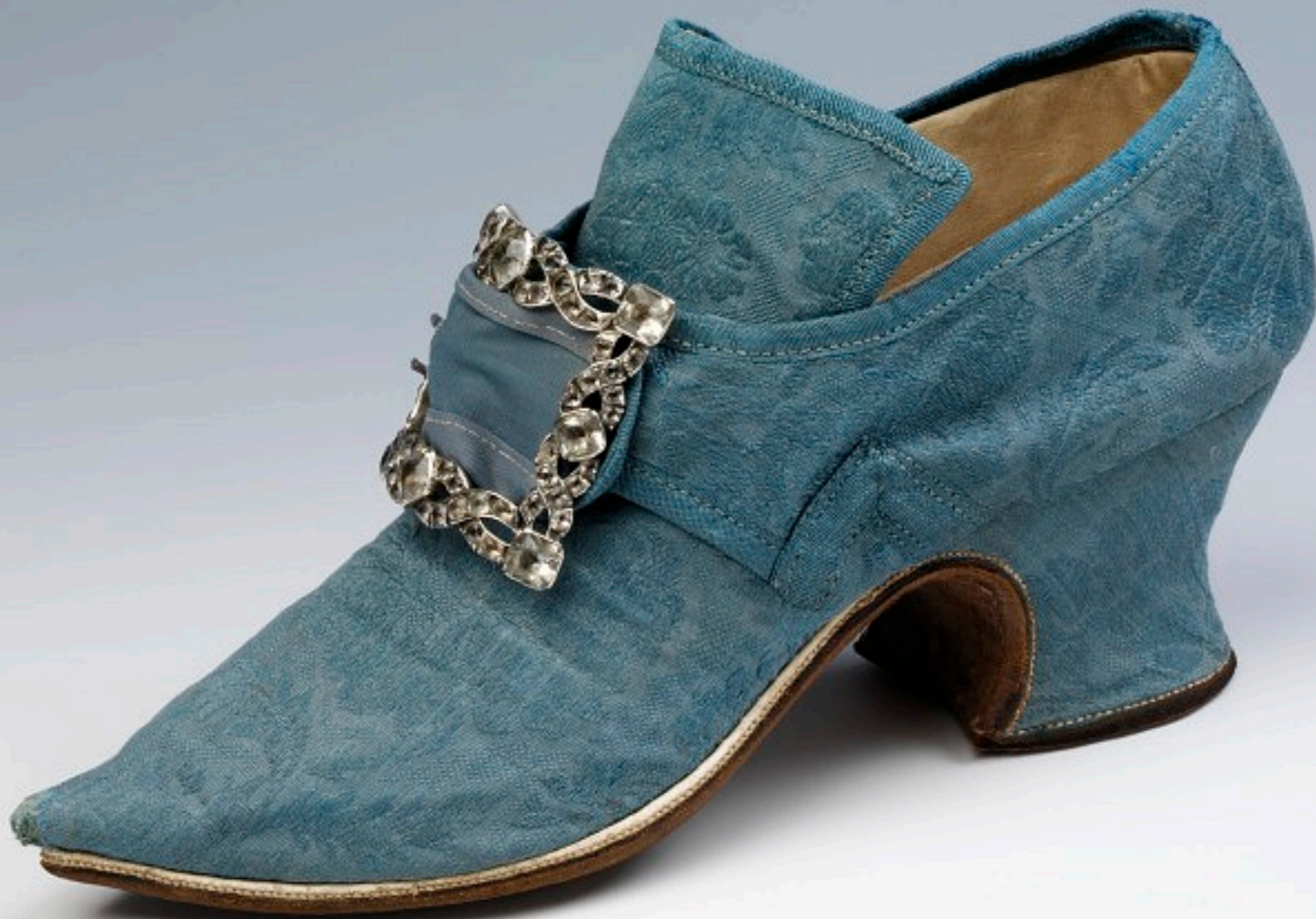
English Silk Damask Buckle Shoe with Buckle