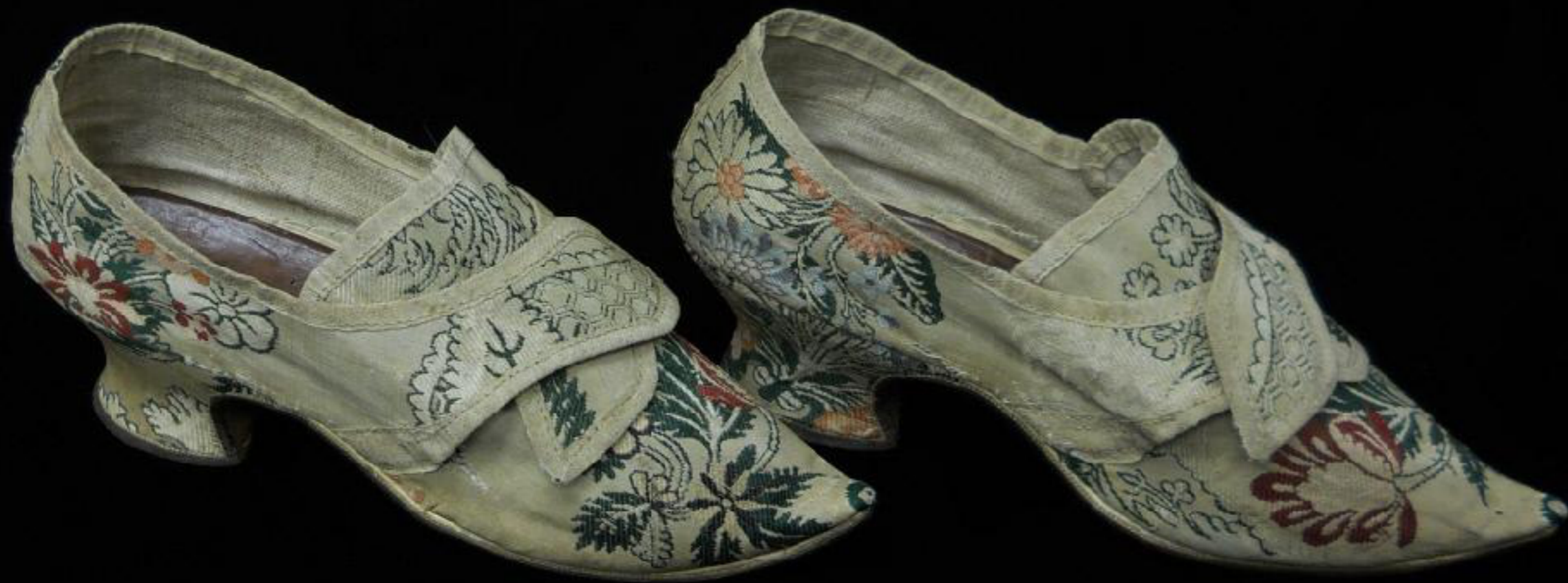
English Brocaded Silk Buckle Shoes c. 1740 - 1760 (Colonial Williamsburg Foundation)