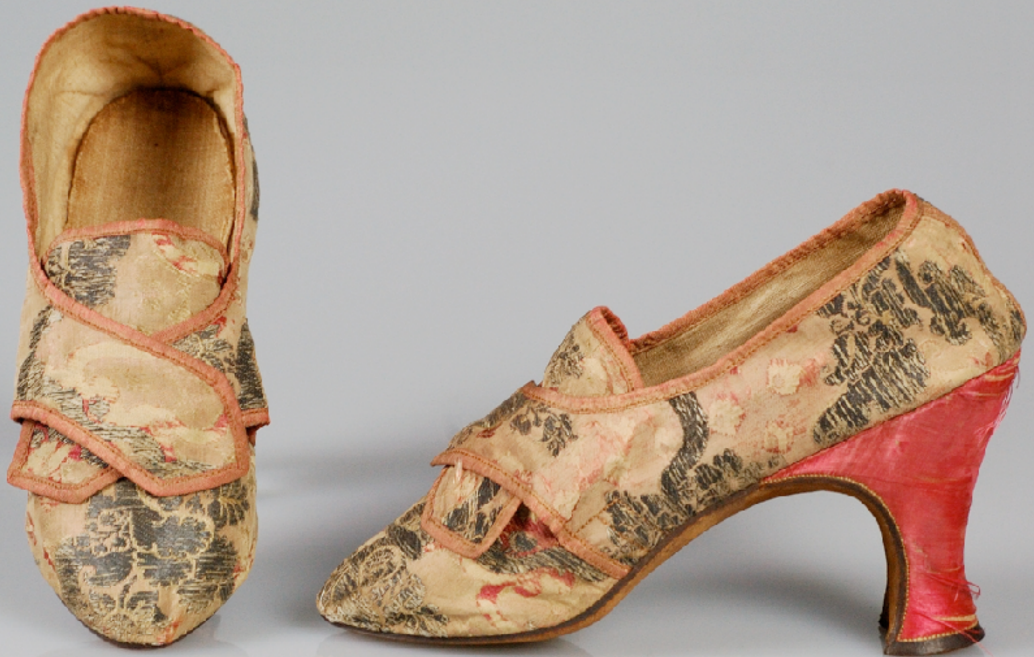
French Silk Buckle Shoes c. 1750 (Metropolitan Museum of Art)