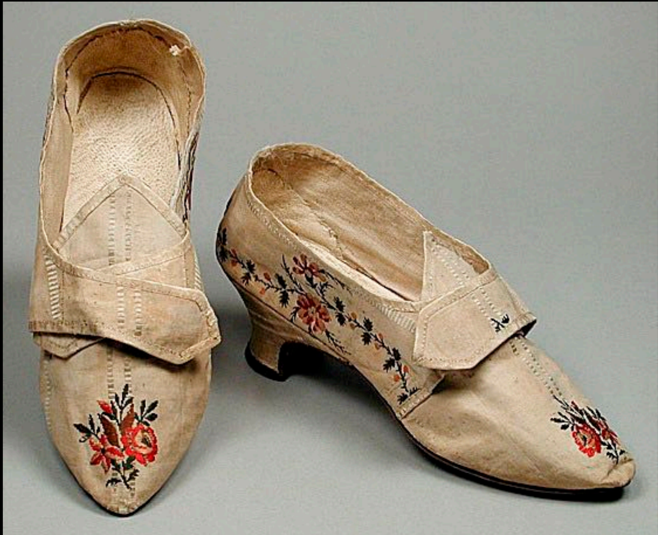
English Silk Embroidered Buckle Shoes