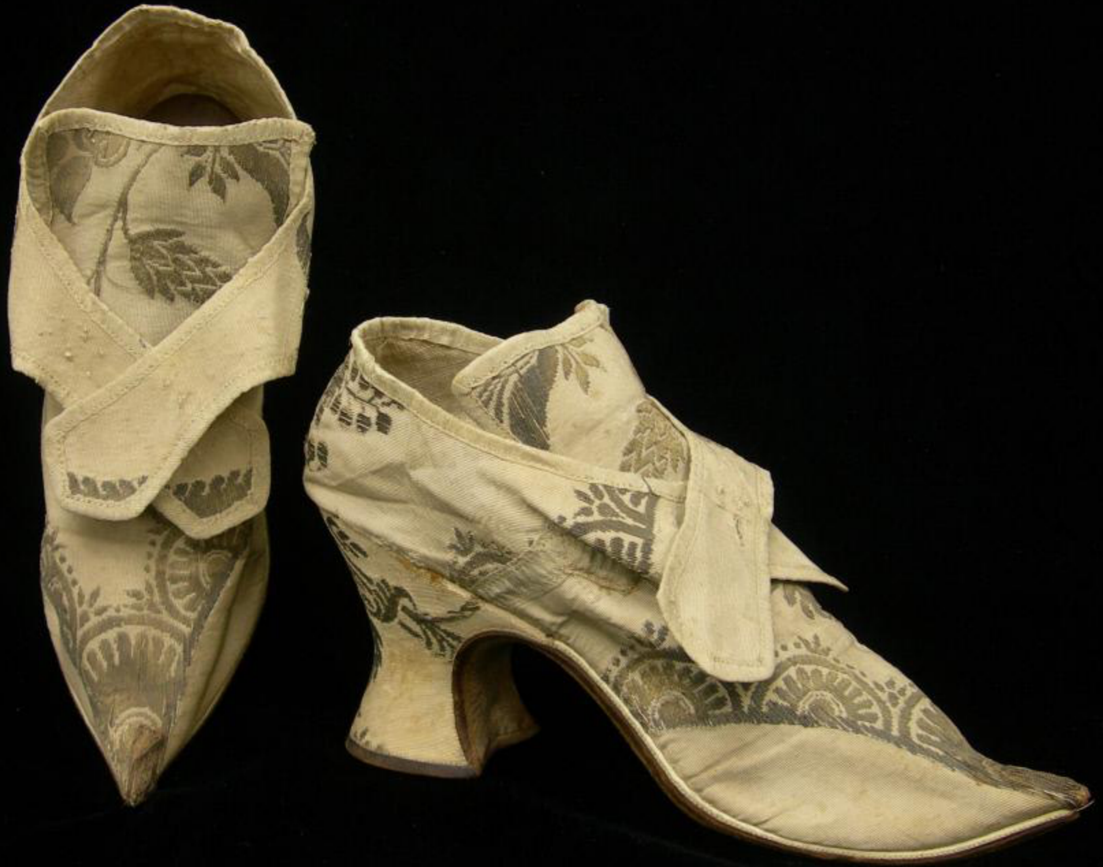
English Brocaded Silk Buckle Shoes c. 1730 - 1750 (Colonial Williamsburg Foundation)