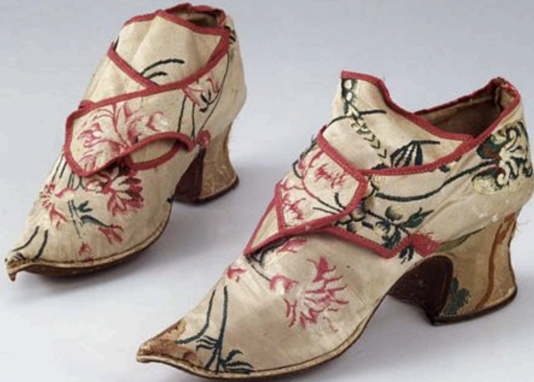
Silk Buckle Shoe Early 18th Century (Private Collection)