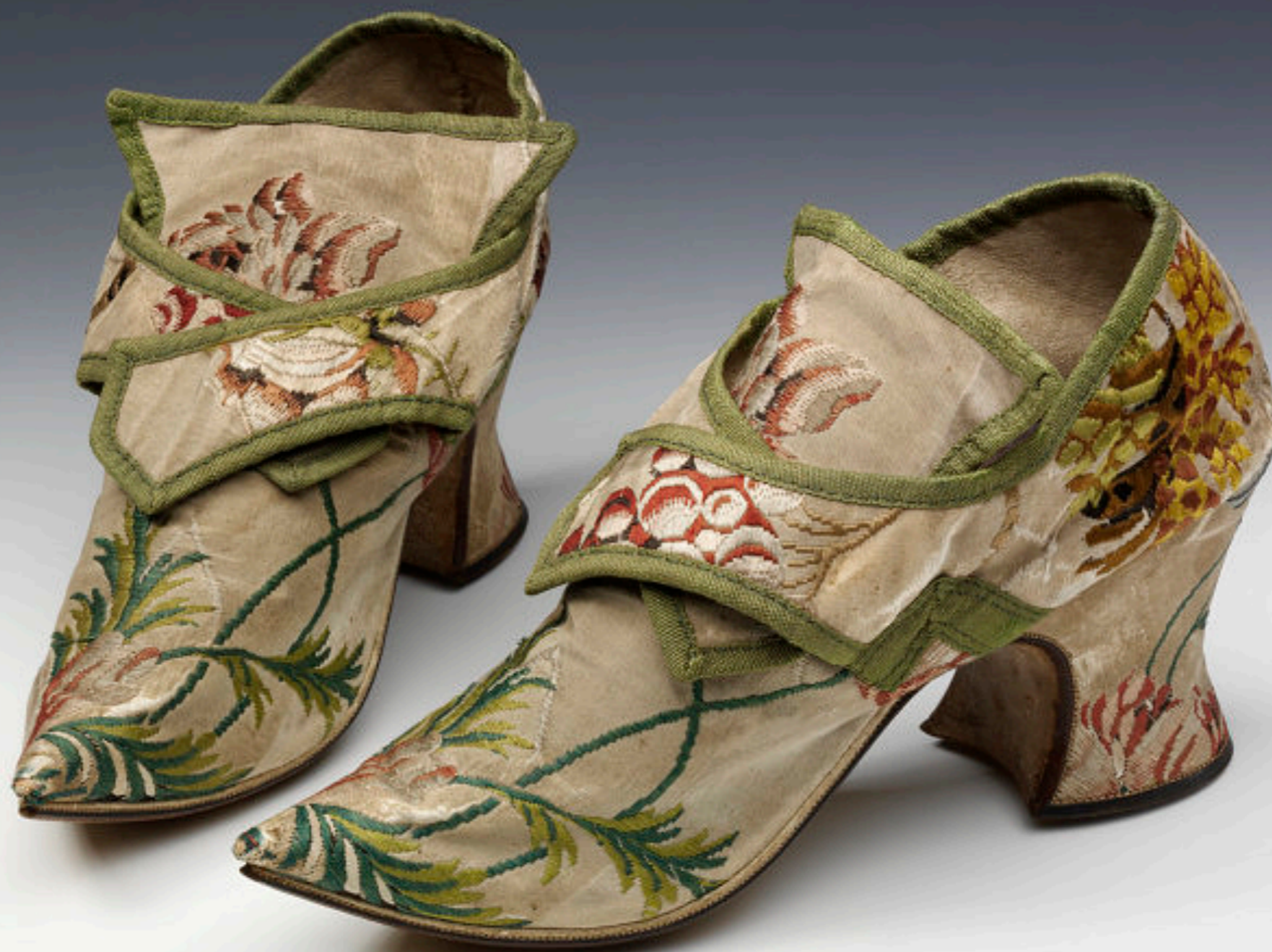
English Brocaded Spitalfields Silk Buckle Shoes