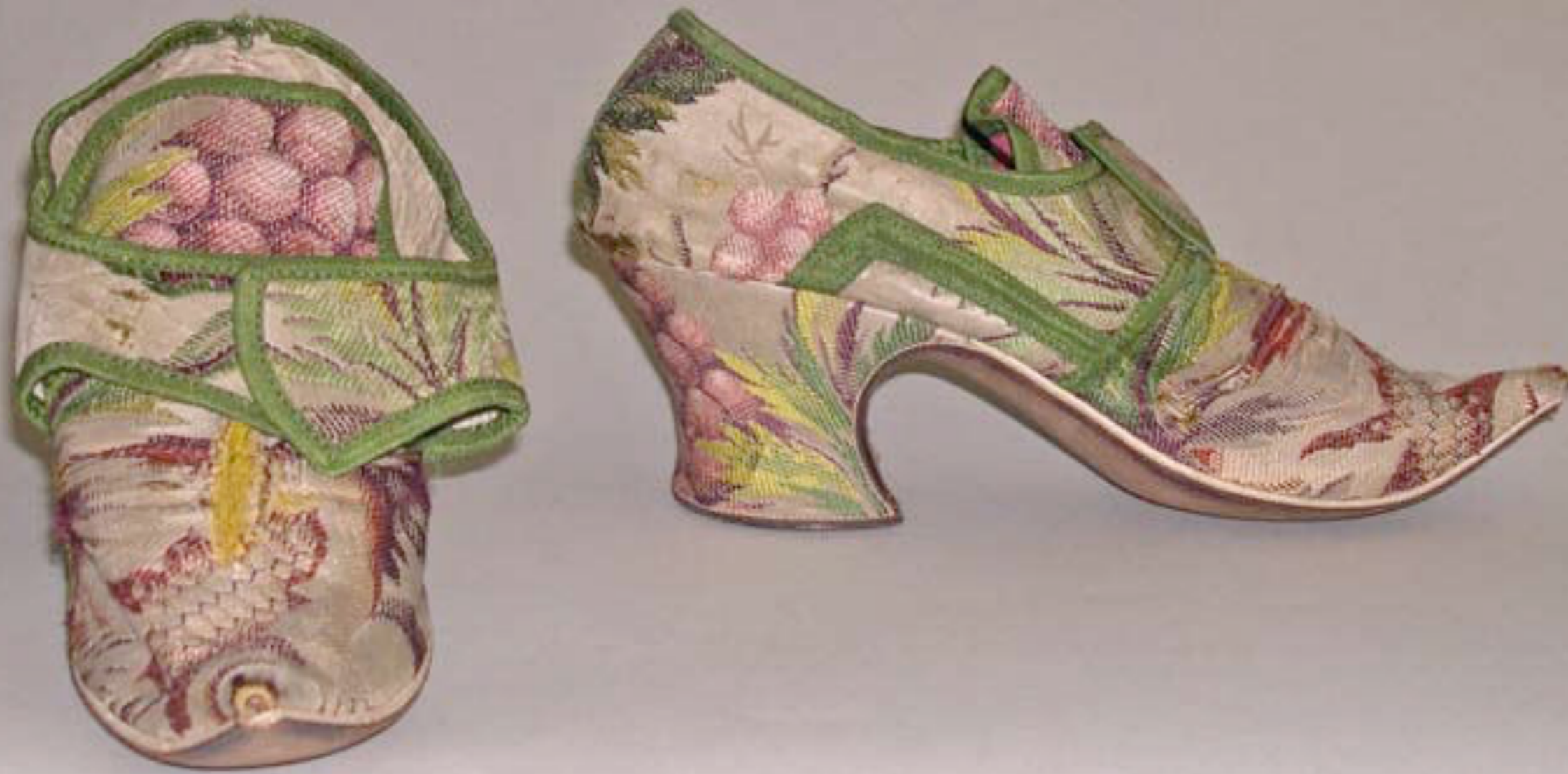
English Silk Buckle Shoes c. 1710 - 1739