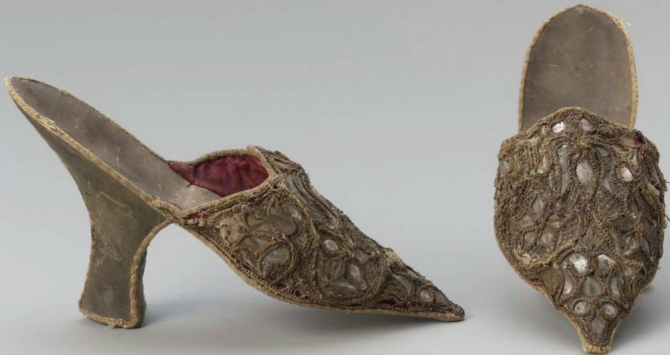
European Mules or Backless Slippers c. 1720 - 1750 (Museum of Fine Arts, Boston)