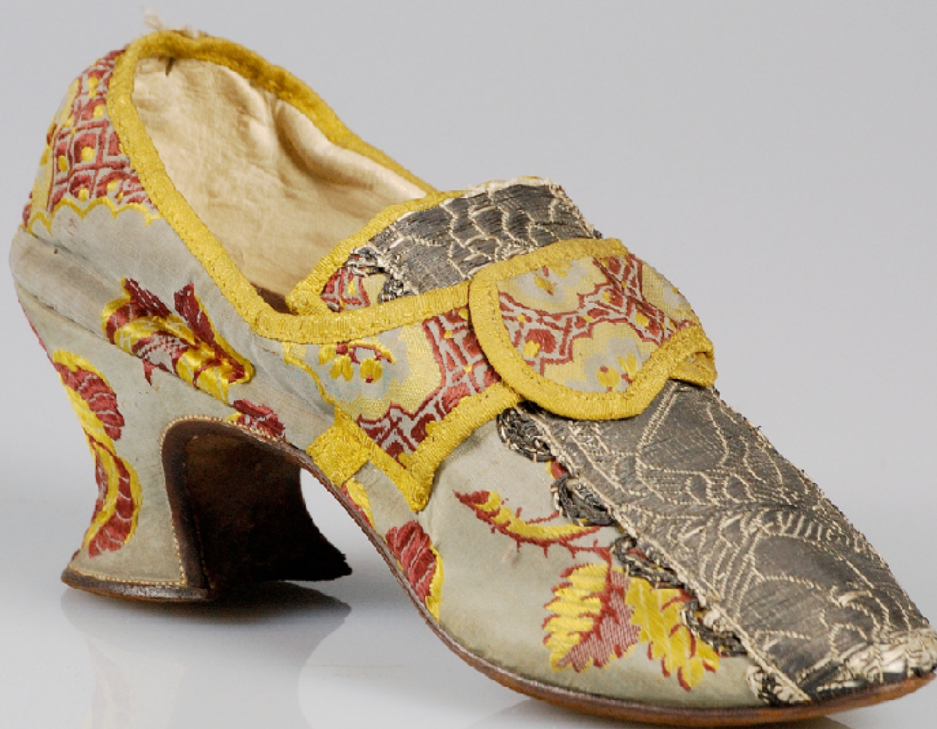
English Silk Buckle Shoes c. 1760 - 1780 (Metropolitan Museum of Art)