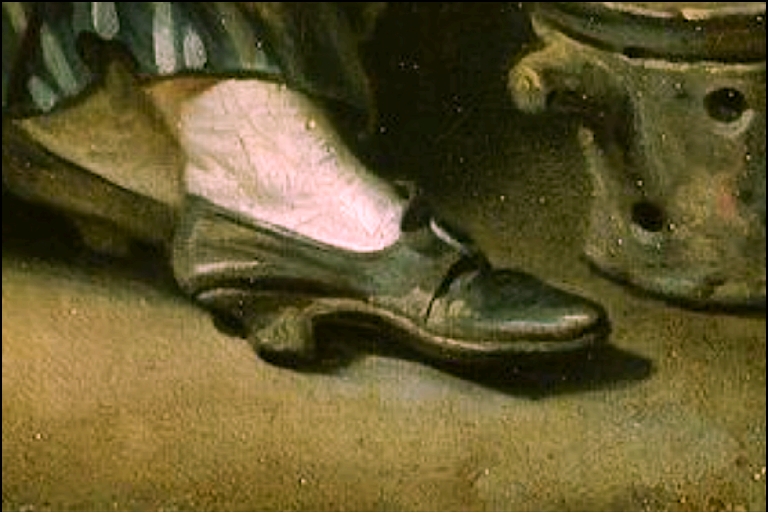
Detail: "Silence!" by Jean-Baptiste Greuze 1759 (The Royal Collection)