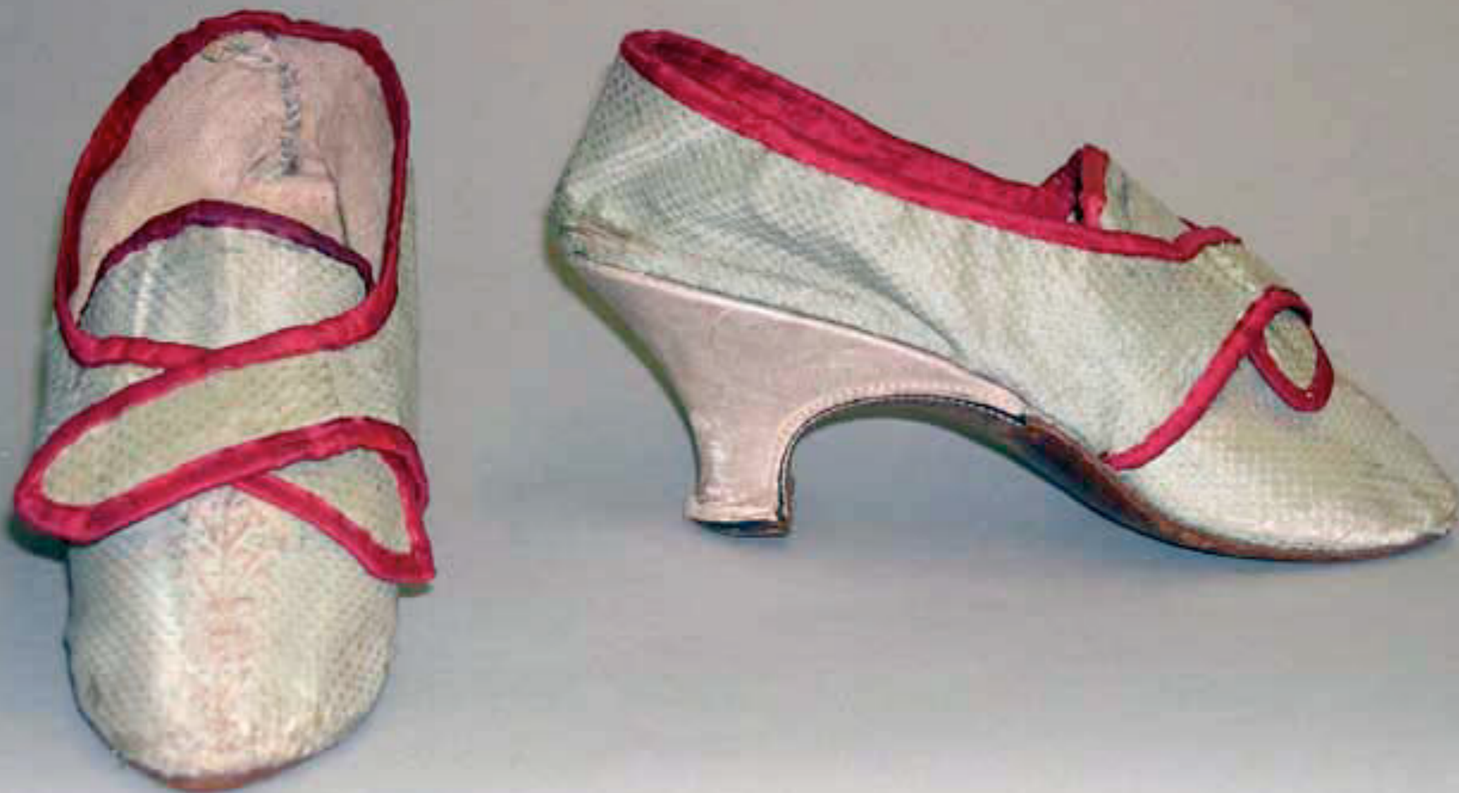
English Silk Buckle Shoes c. 1770 - 1779 (Metropolitan Museum of Art)