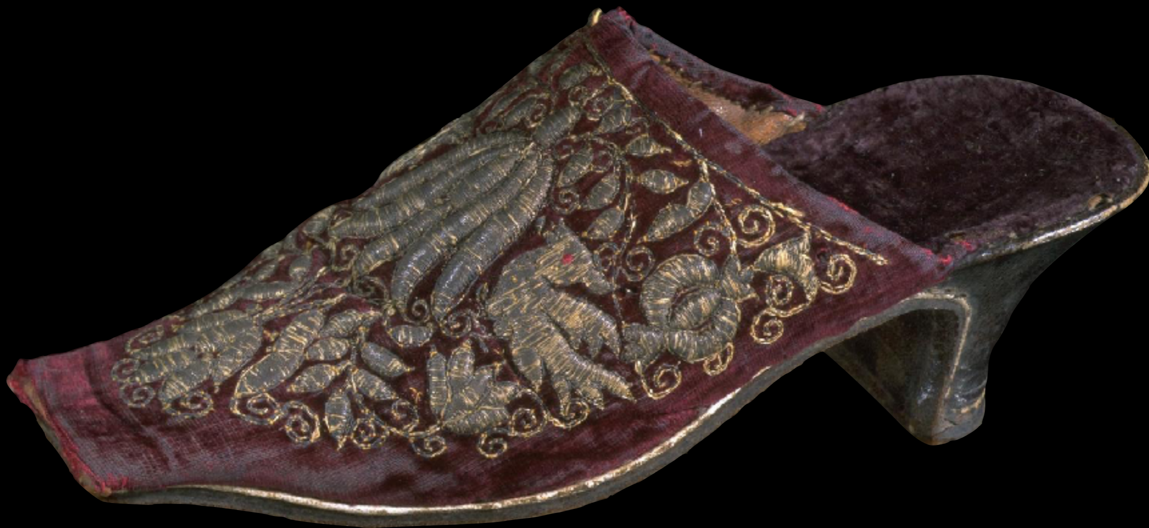
English Embroidered Velvet Mule or Backless Slipper c. 1650 - 1660