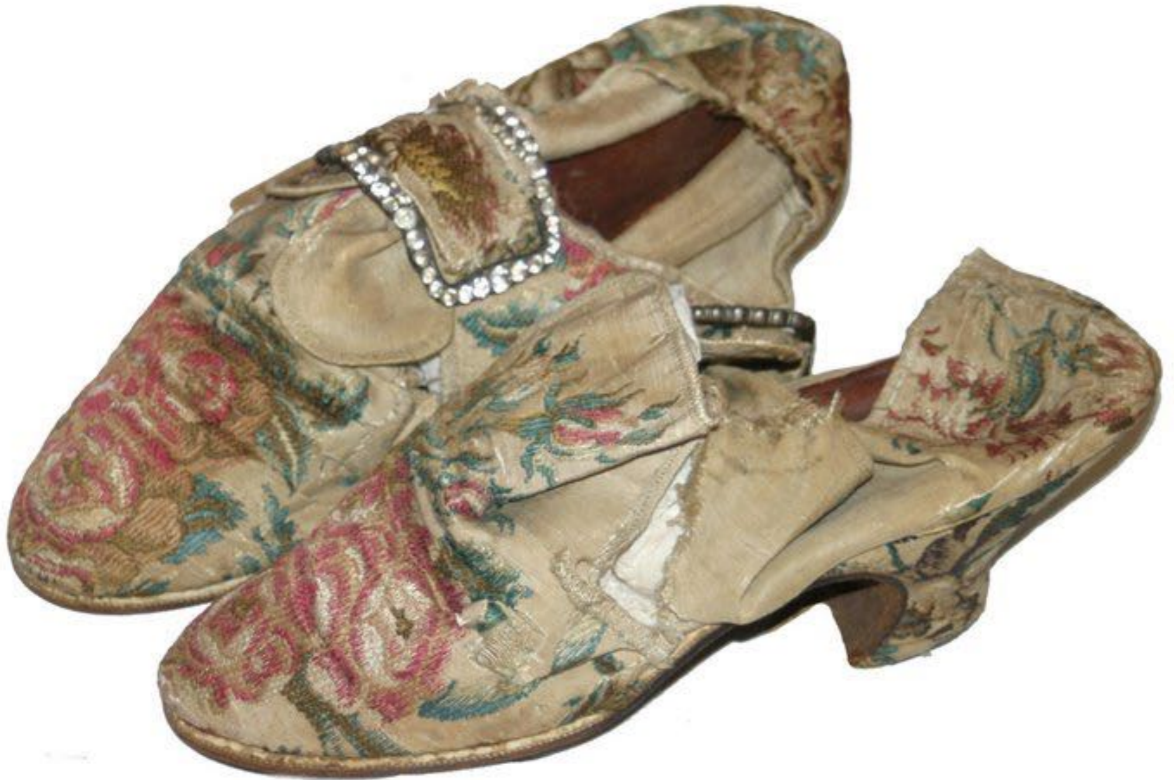
American or English Silk Shoes with Paste Buckles Owned by General Nathaniel Greene's Wife, Kitty Greene (Private Collection)