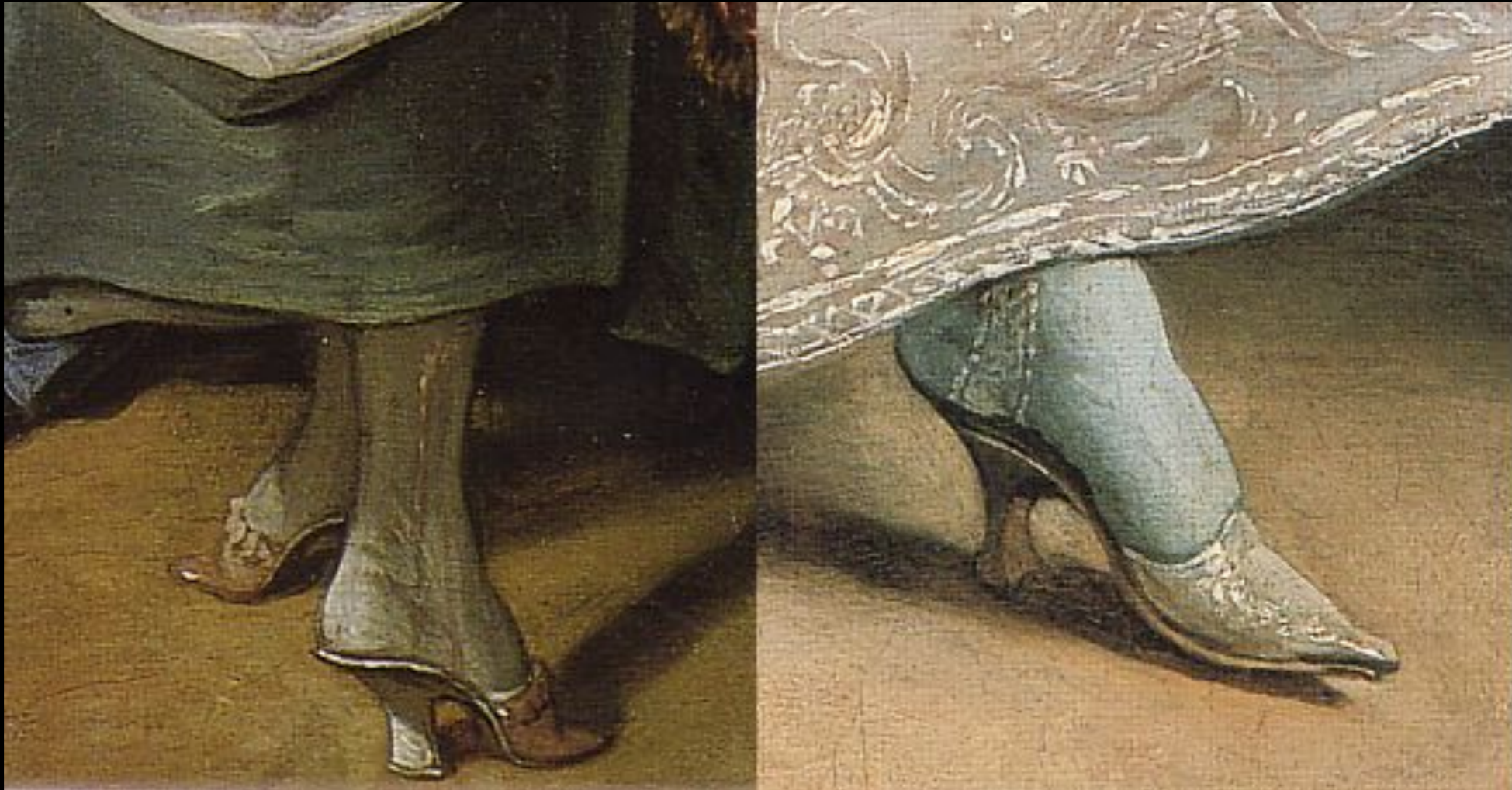
European Mules in Art c. 1720 - 1750