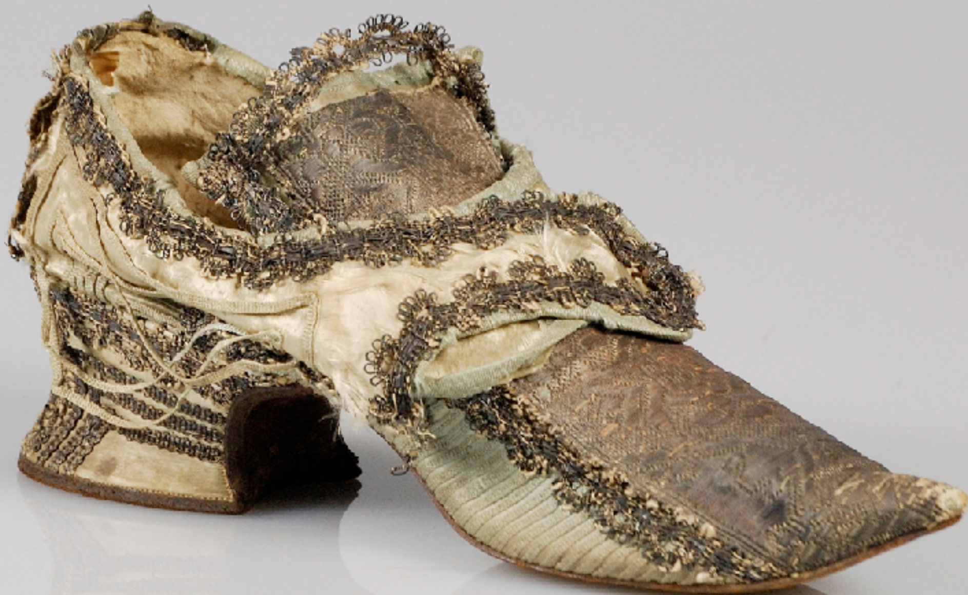
English Metallic Lace & Silk Buckle Shoes