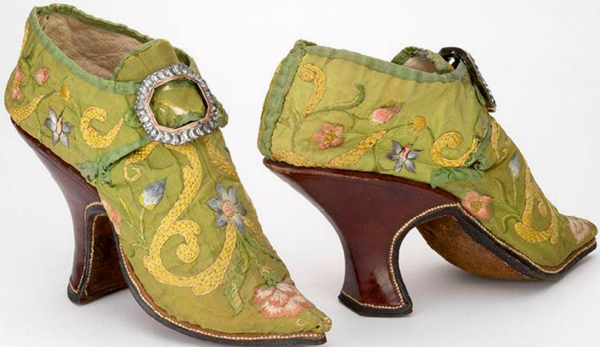
Italian Embroidered Silk Buckle Shoes