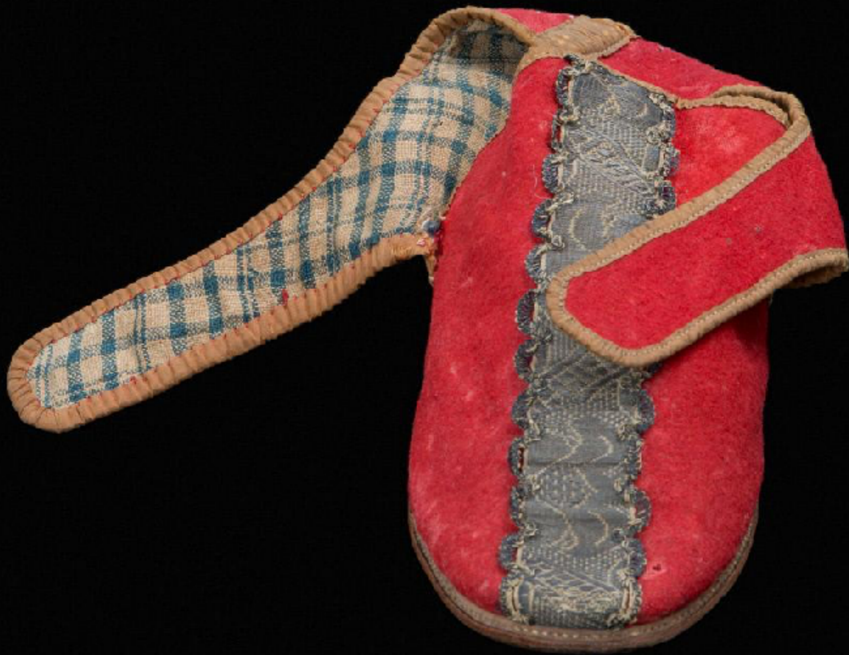
American Wool & Linen Buckle Shoes from New England c. 1750 (Colonial Williamsburg Foundation)