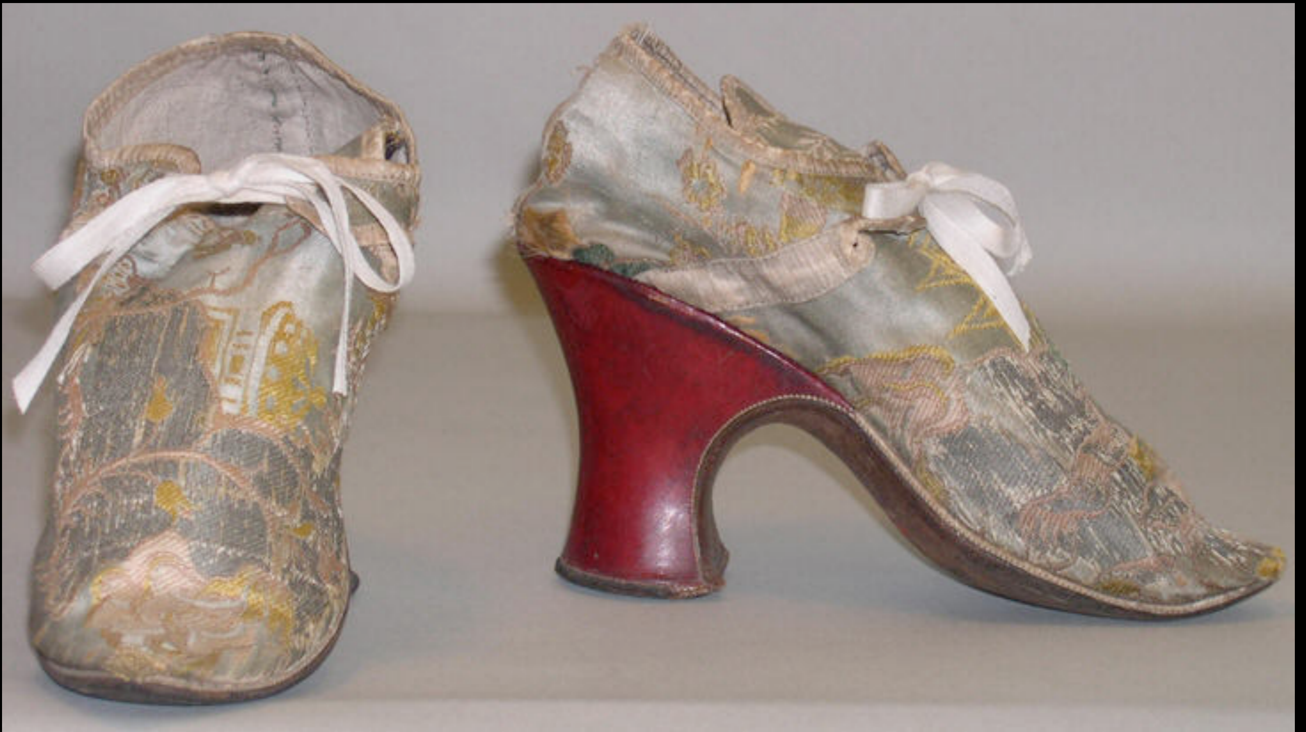
English Silk Tie Shoes with Red Leather Heels