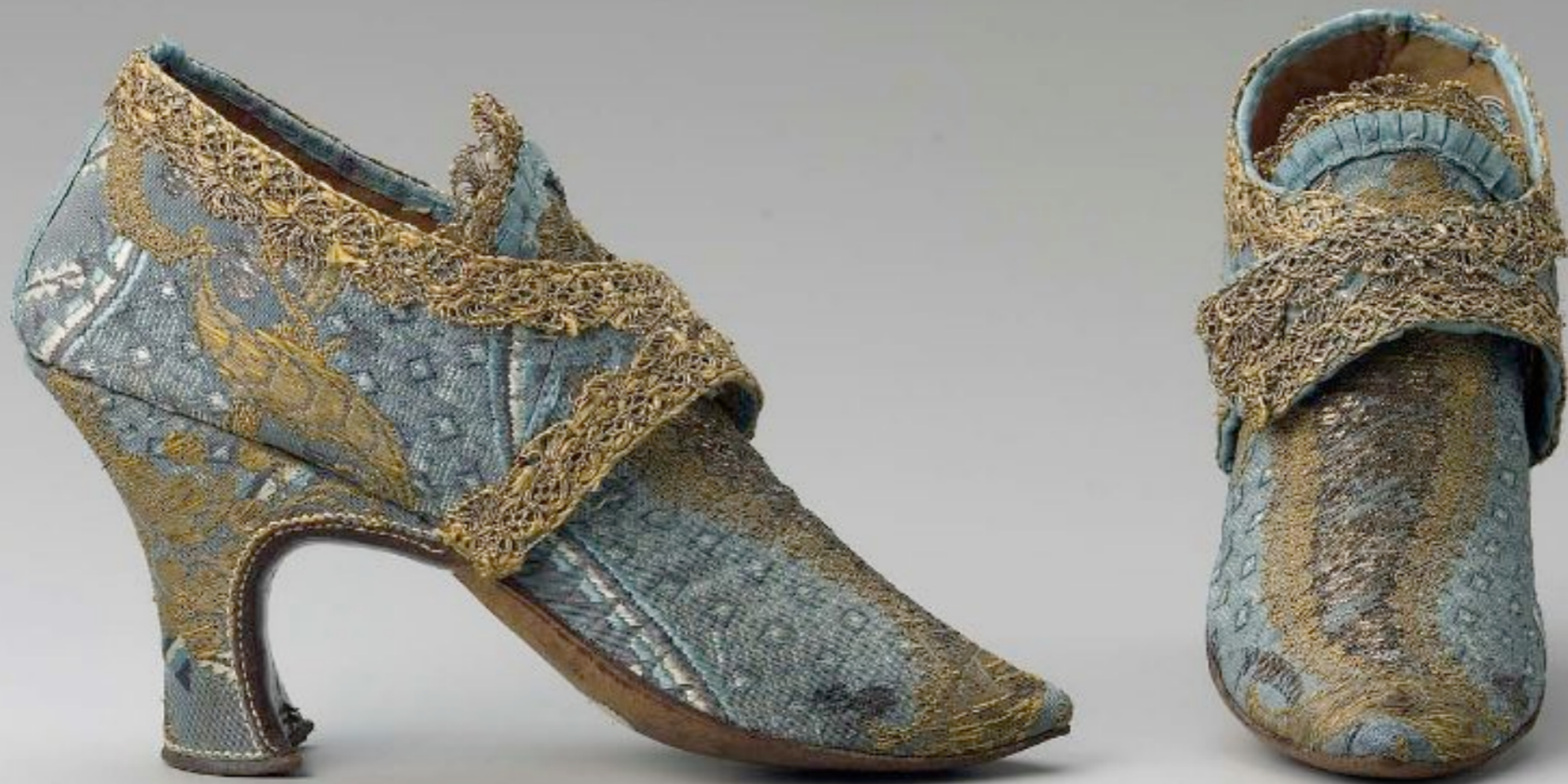
Italian Buckle Shoes c. 1760 - 1780 (Museum of Fine Arts, Boston)