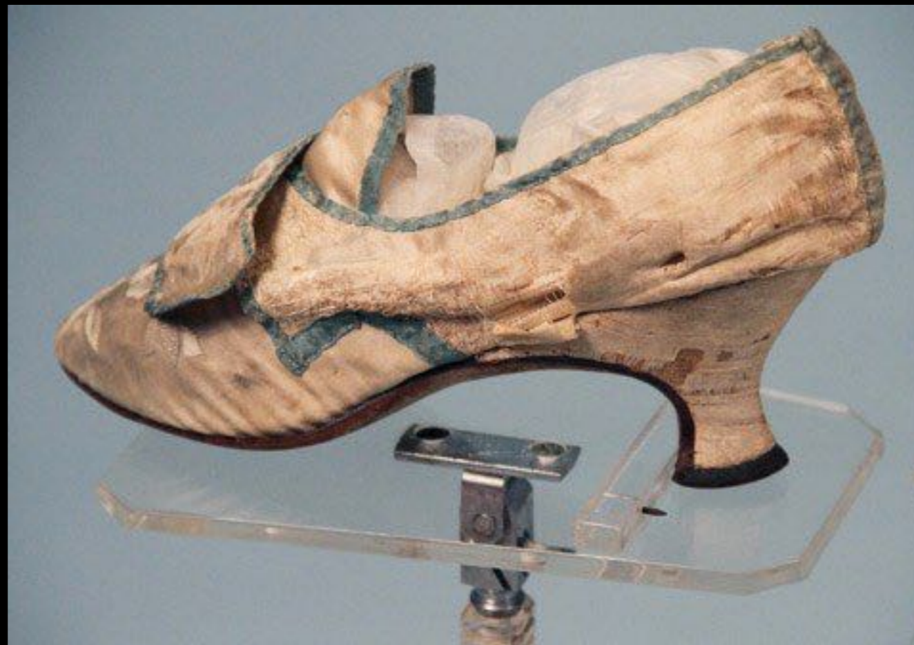
Silk Buckle Shoe