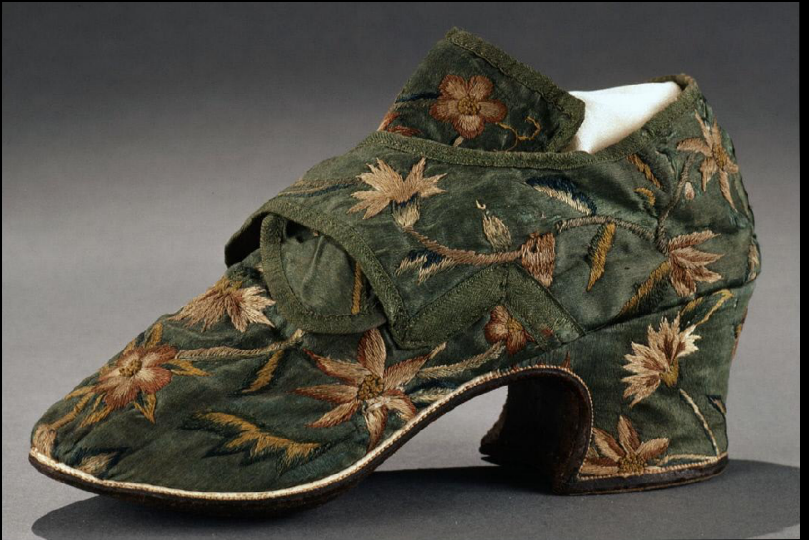
English Silk Needlework on Satin Buckle Shoe c. 1730 - 1740 (Colonial Williamsburg Foundation)