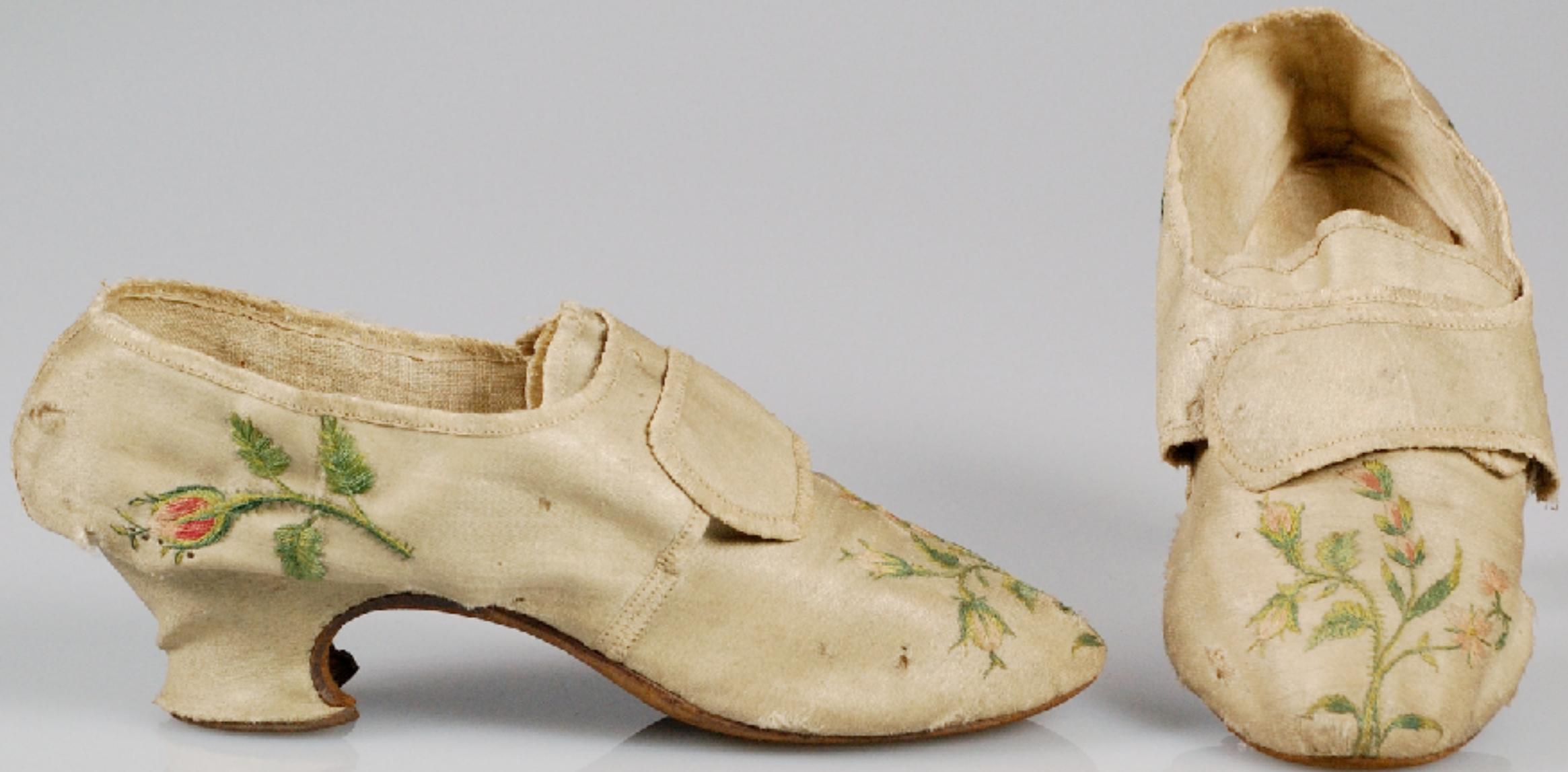
English Silk Buckle Shoes c. 1740 - 1760 (Metropolitan Museum of Art)