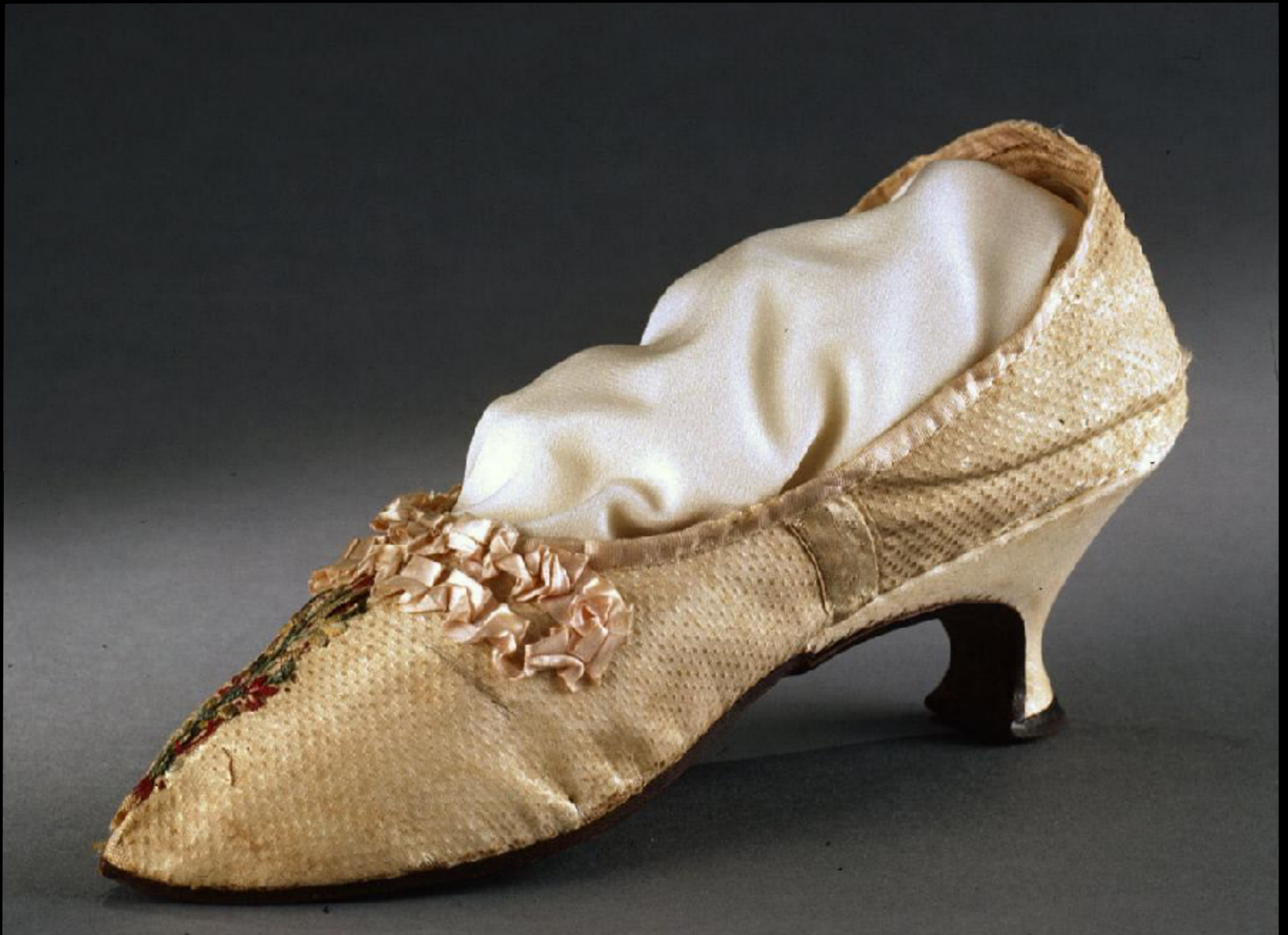
English Embroidered Silk Shoe c. 1780 - 1785