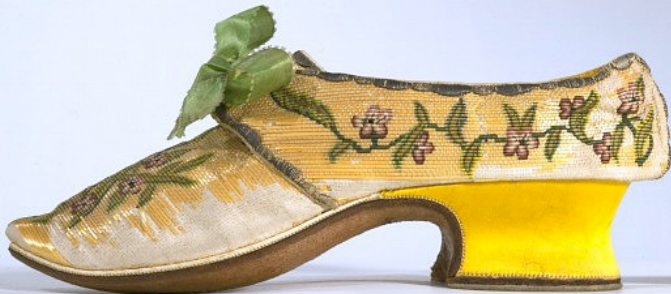
French or German Couch Straw Splints Tie Shoe