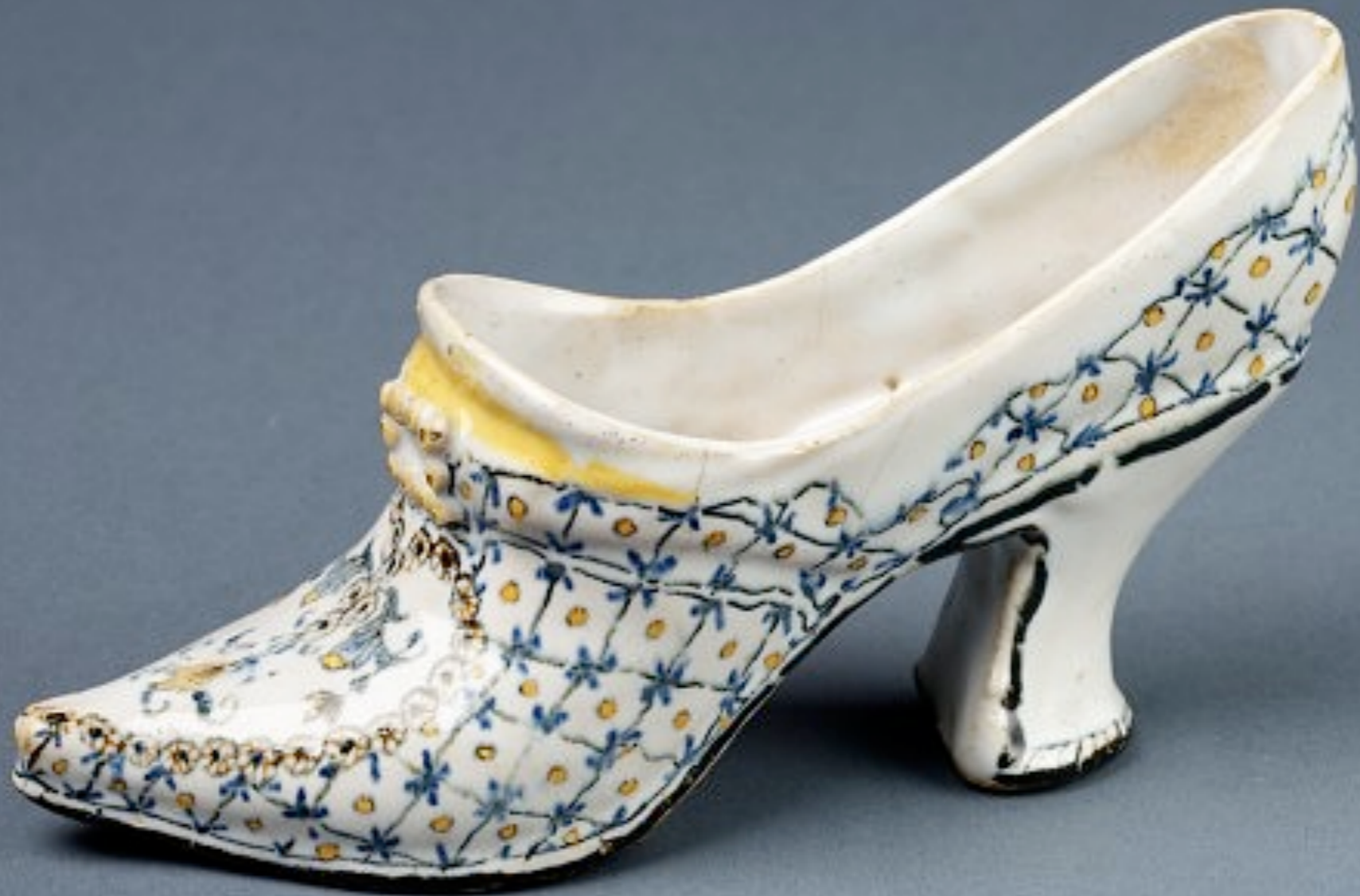
French Tin Glazed Earthenware Shoe