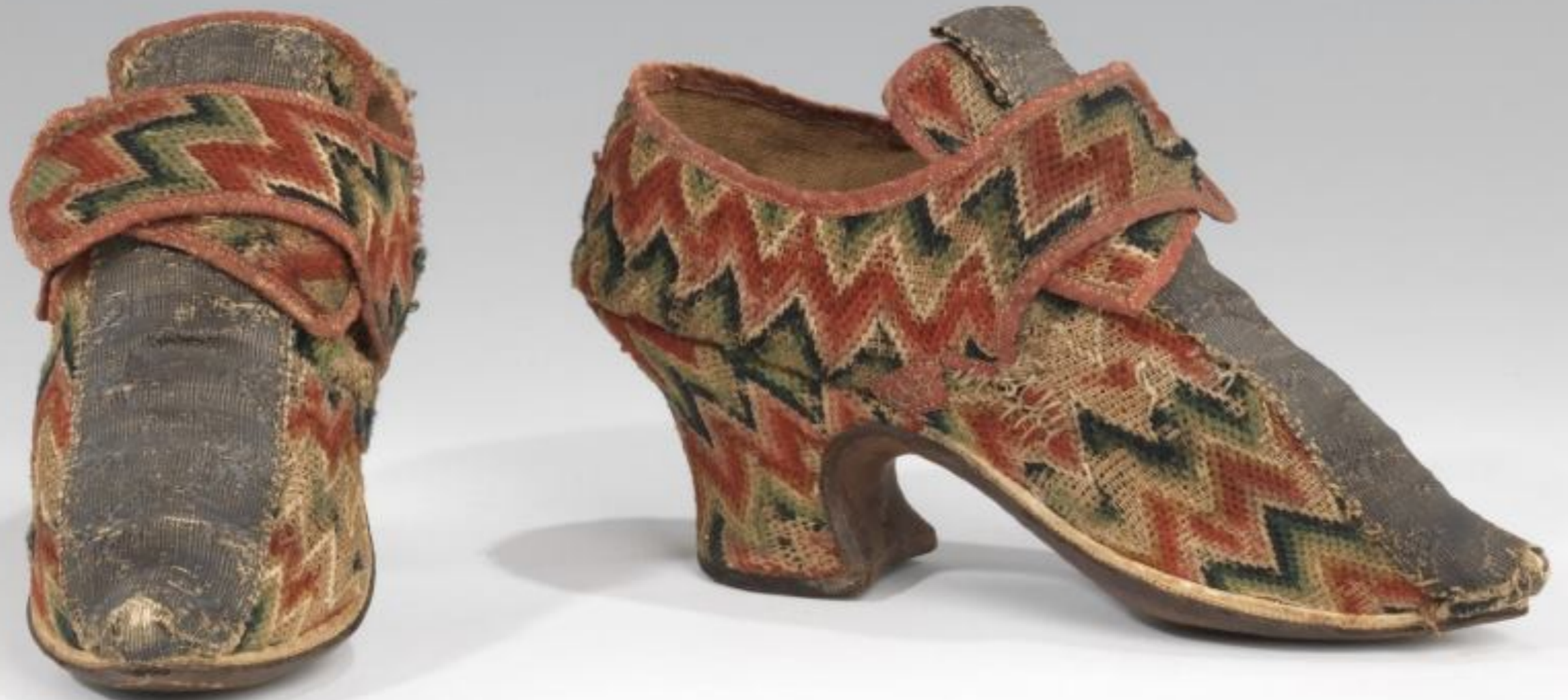
English Irish Stitch Wool Buckle Shoes c. 1700 - 1729 (Metropolitan Museum of Art)