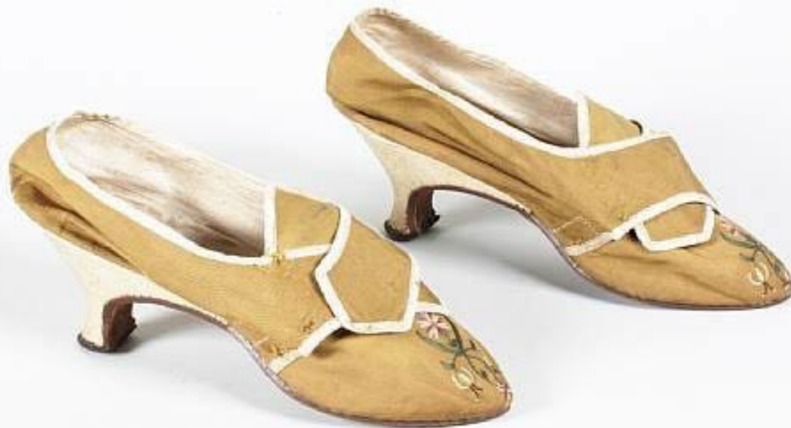
English Silk Buckle Shoes