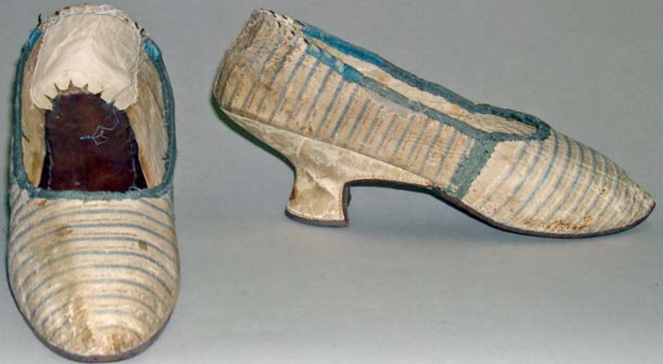
American (or European) Slipper Shoe c. 1780 (Metropolitan Museum of Art)