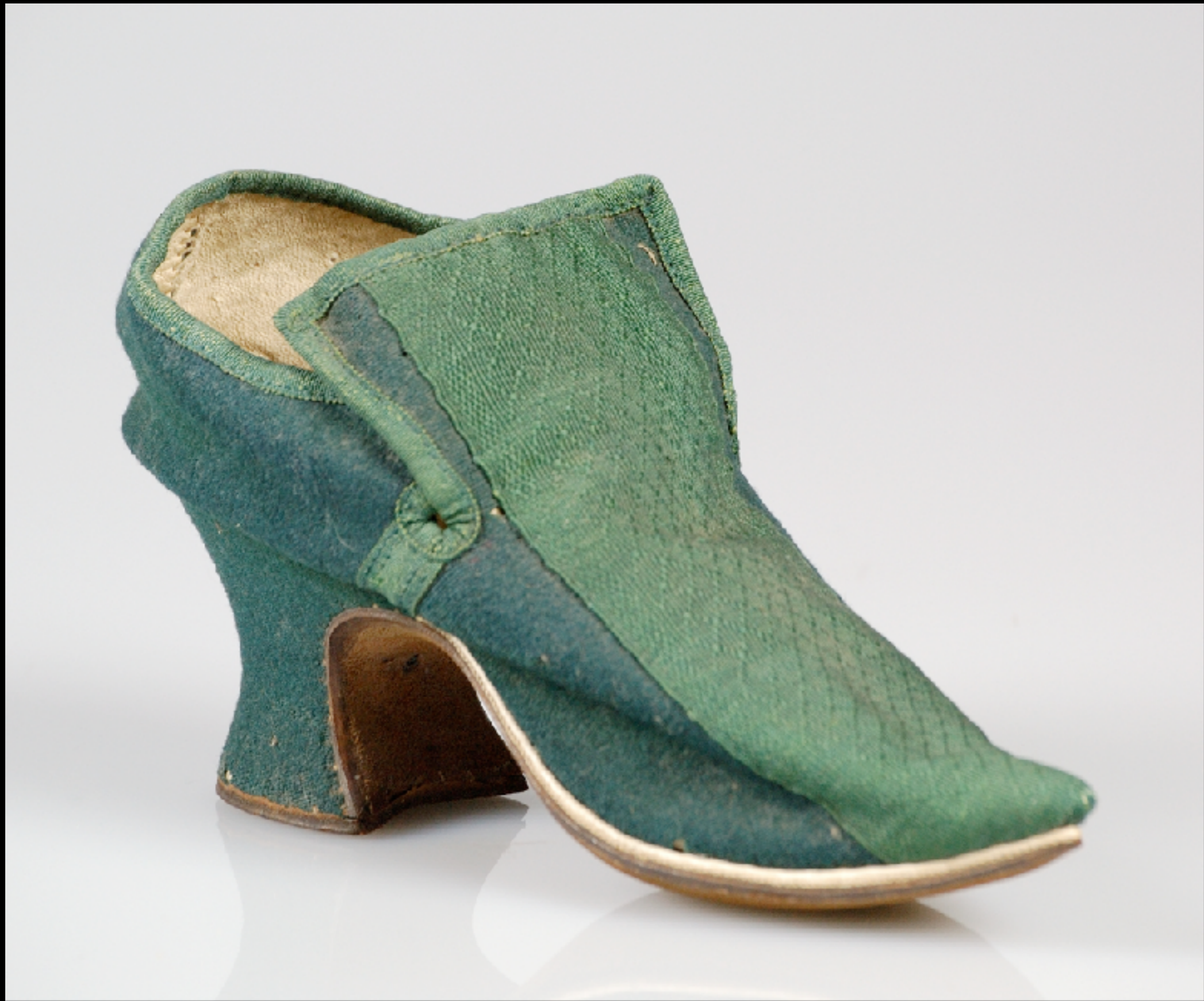
English Wool Shoes c. 1700 - 1720 (Metropolitan Museum of Art)