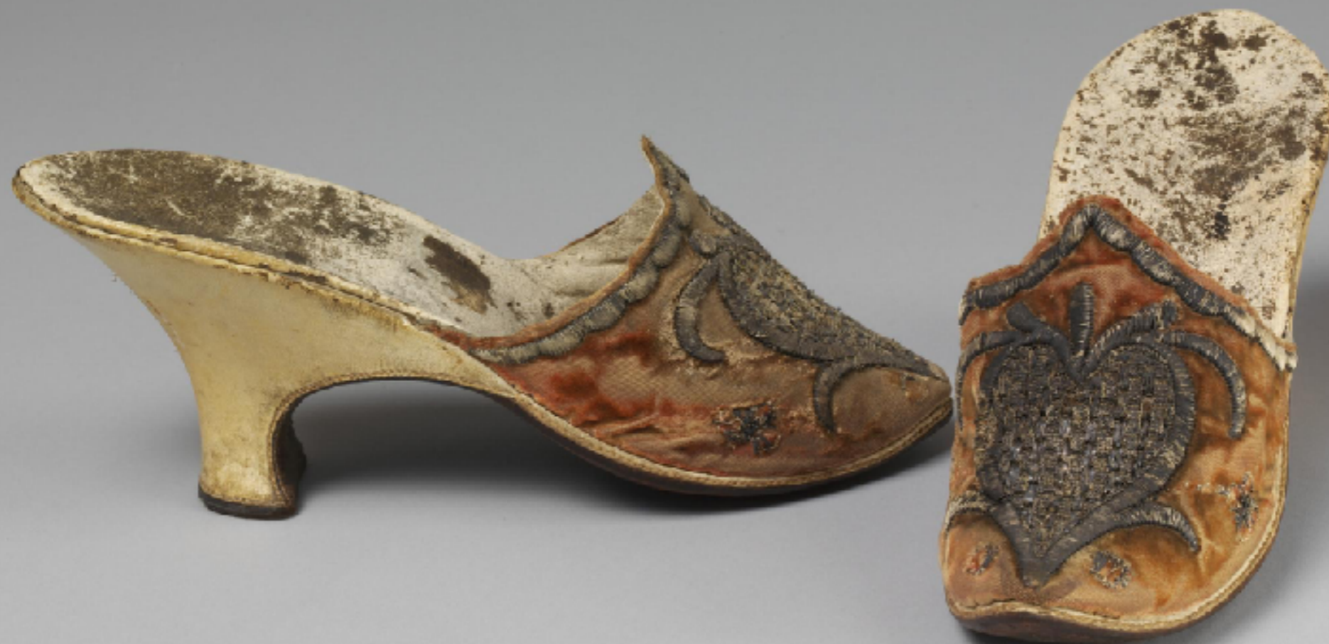
French Embroidered Silk Mules or Backless Slippers