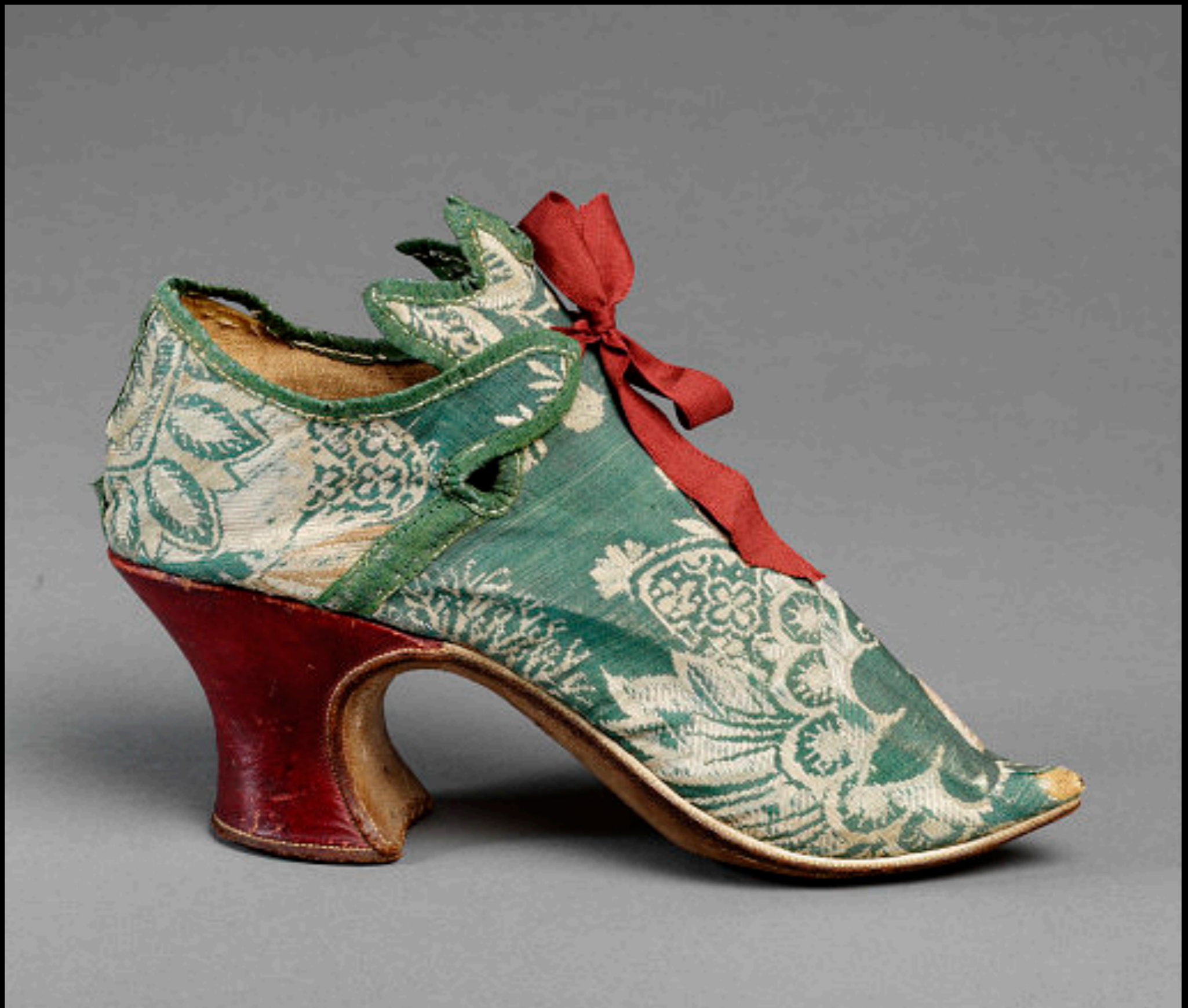
English Silk Brocade & Leather Tie Shoes