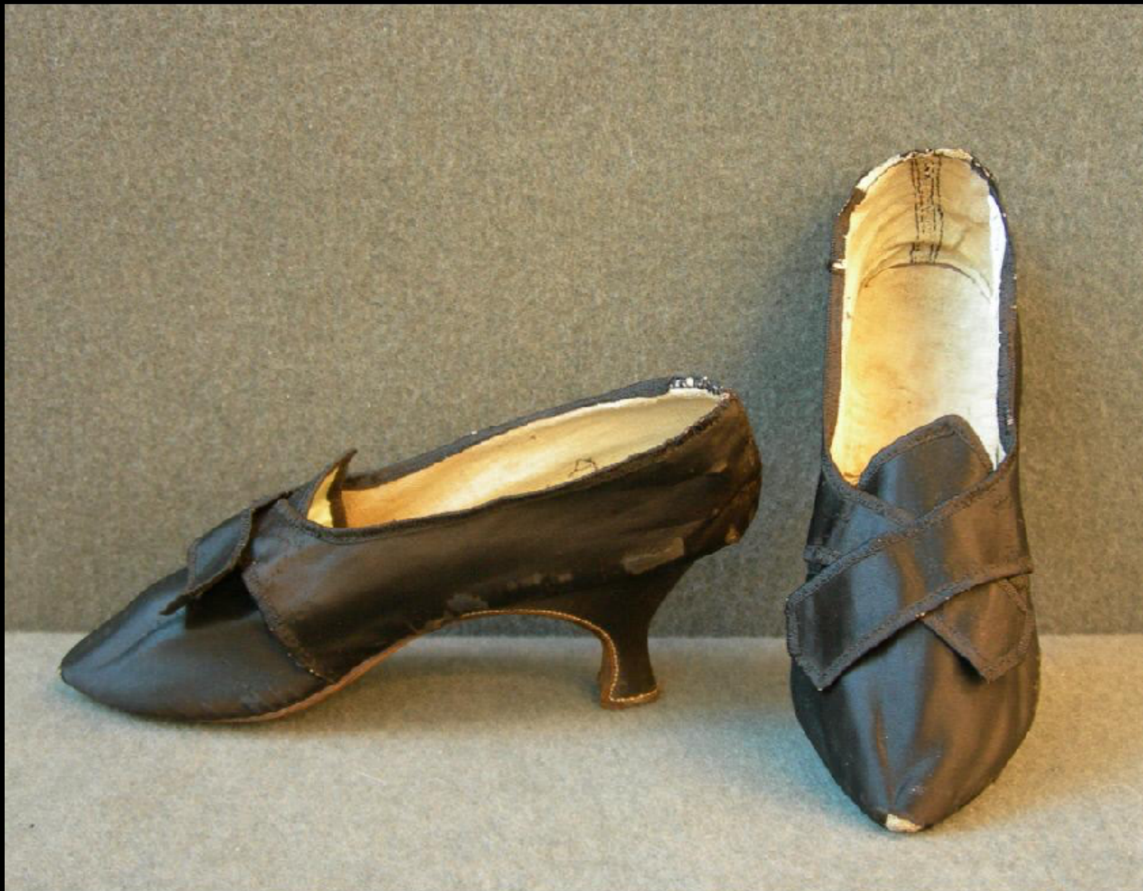
English Black Satin Buckle Shoes Worn by a Member of the Glen-Sanders Family, Scotia, New York c. 1775 - 1785