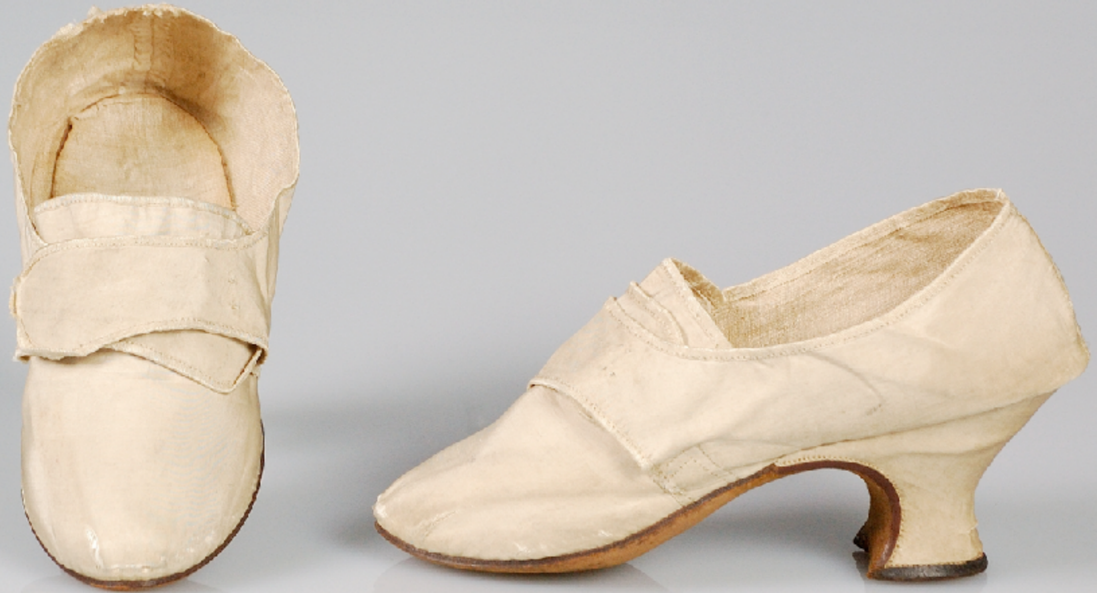
English Silk Buckle Shoes c. 1760 - 1769 (Metropolitan Museum of Art)