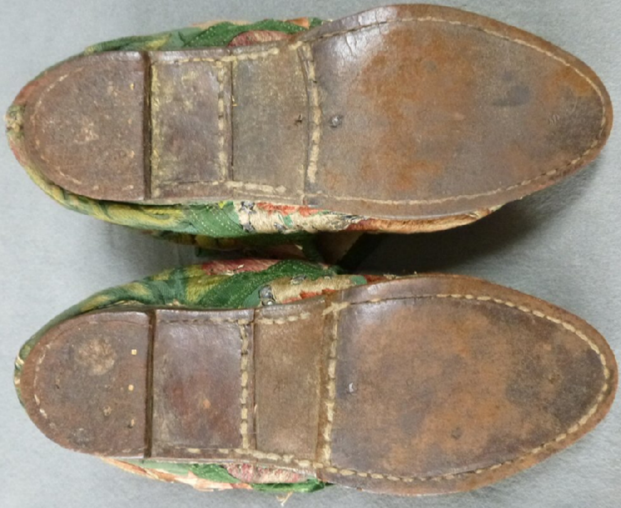
Flat Heeled Silk Buckle Shoes, Likely Made for an Older Woman