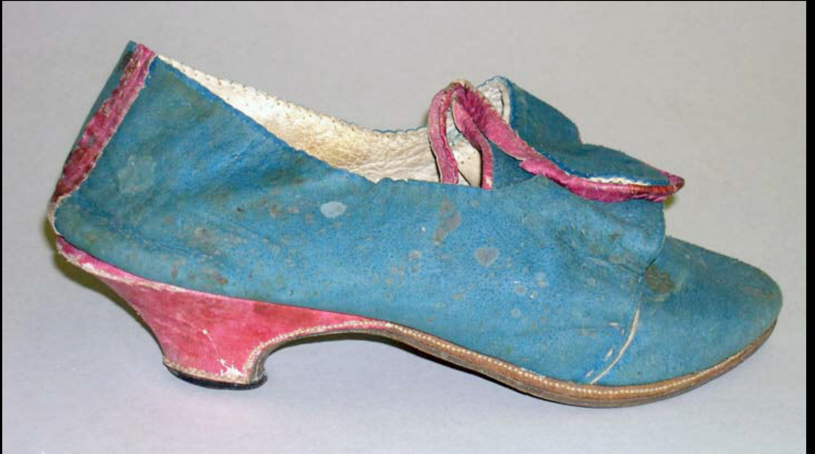
Italian Silk Buckle Shoe Late 18th Century (Metropolitan Museum of Art)