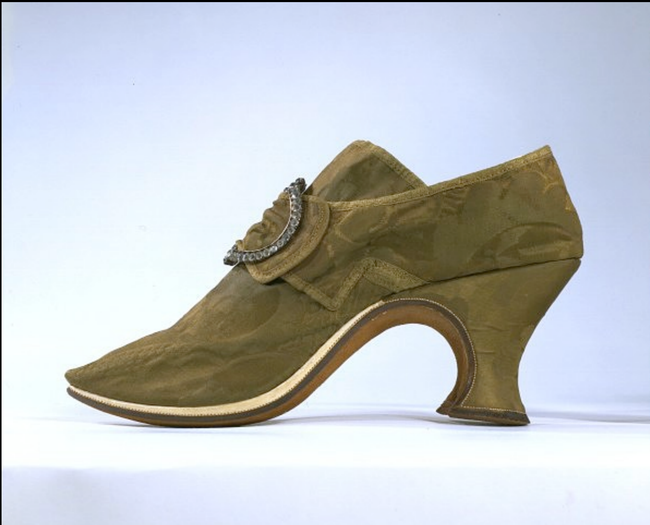
English Shoe with Buckle by Gresham of London c. 1750 (Victoria & Albert Museum)