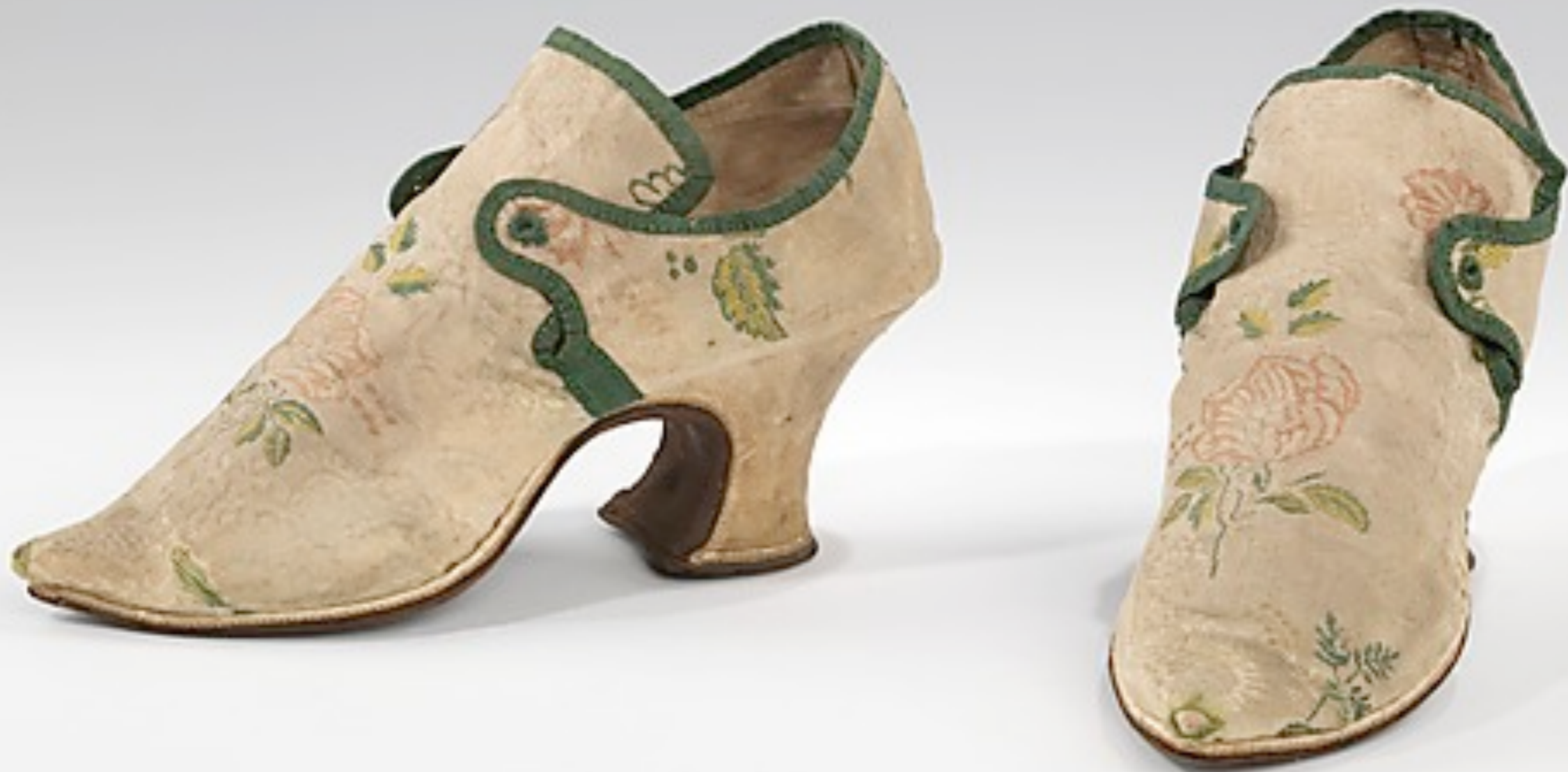
English Silk Tie Shoes c. 1700 - 1720 (Metropolitan Museum of Art)