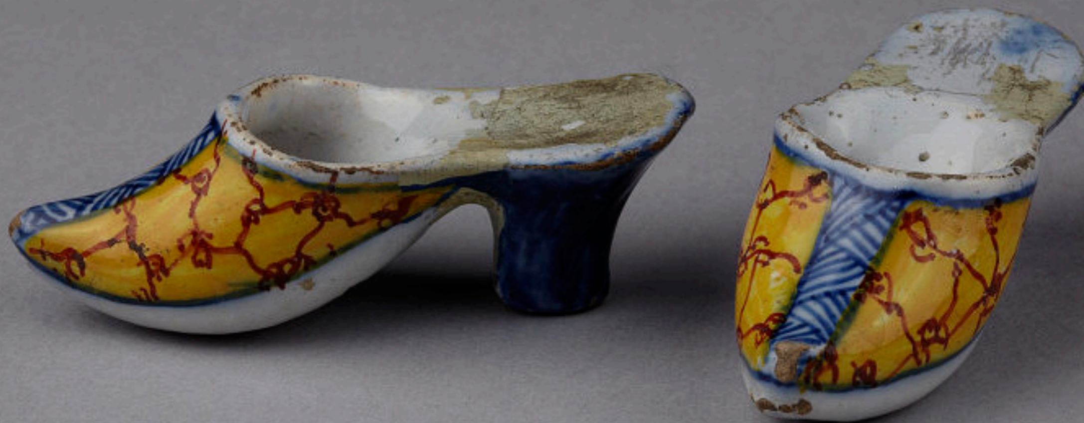
Dutch Tin Glazed Earthenware Slippers or "Mules" 18th Century (Victoria & Albert Museum)