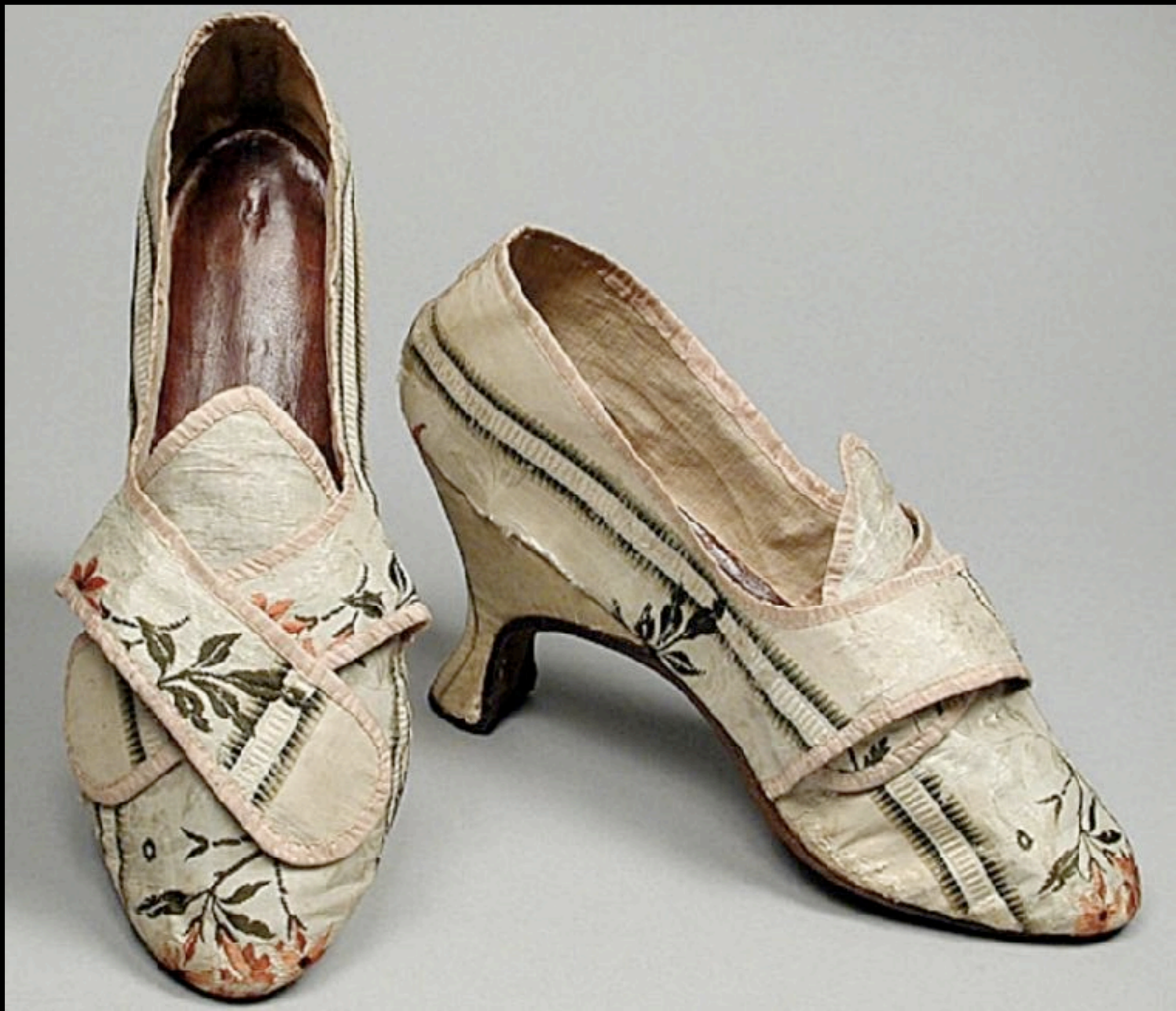
Silk Buckle Shoes Mid 18th Century (Private Collection)