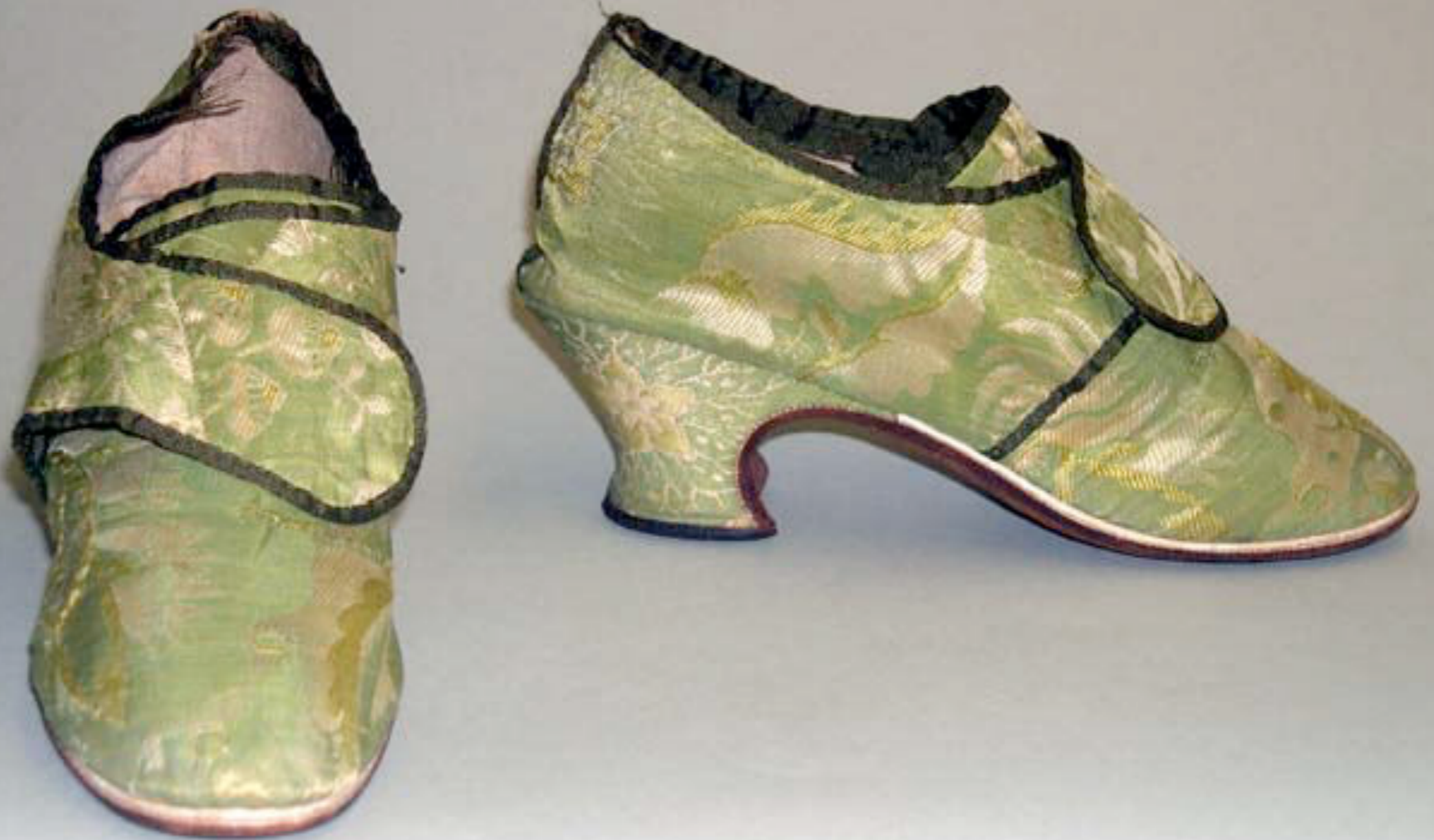
American (or European) Silk Buckle Shoes c. 1760 - 1769 (Metropolitan Museum of Art)