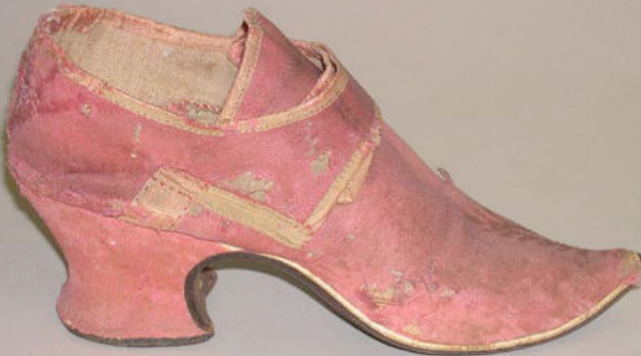
English Wool Buckle Shoes c. 1740 - 1749 (Metropolitan Museum of Art)