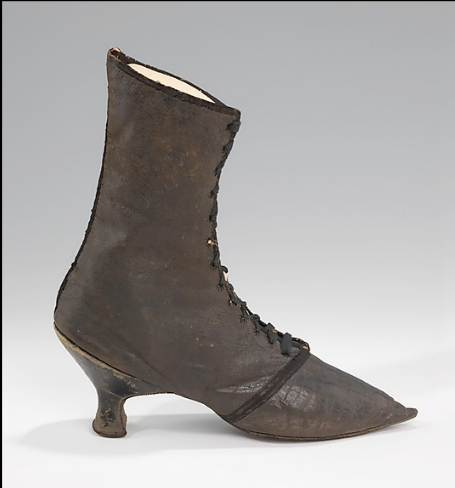
European Boot for Women c. 1780 - 1795 (Metropolitan Museum of Art)