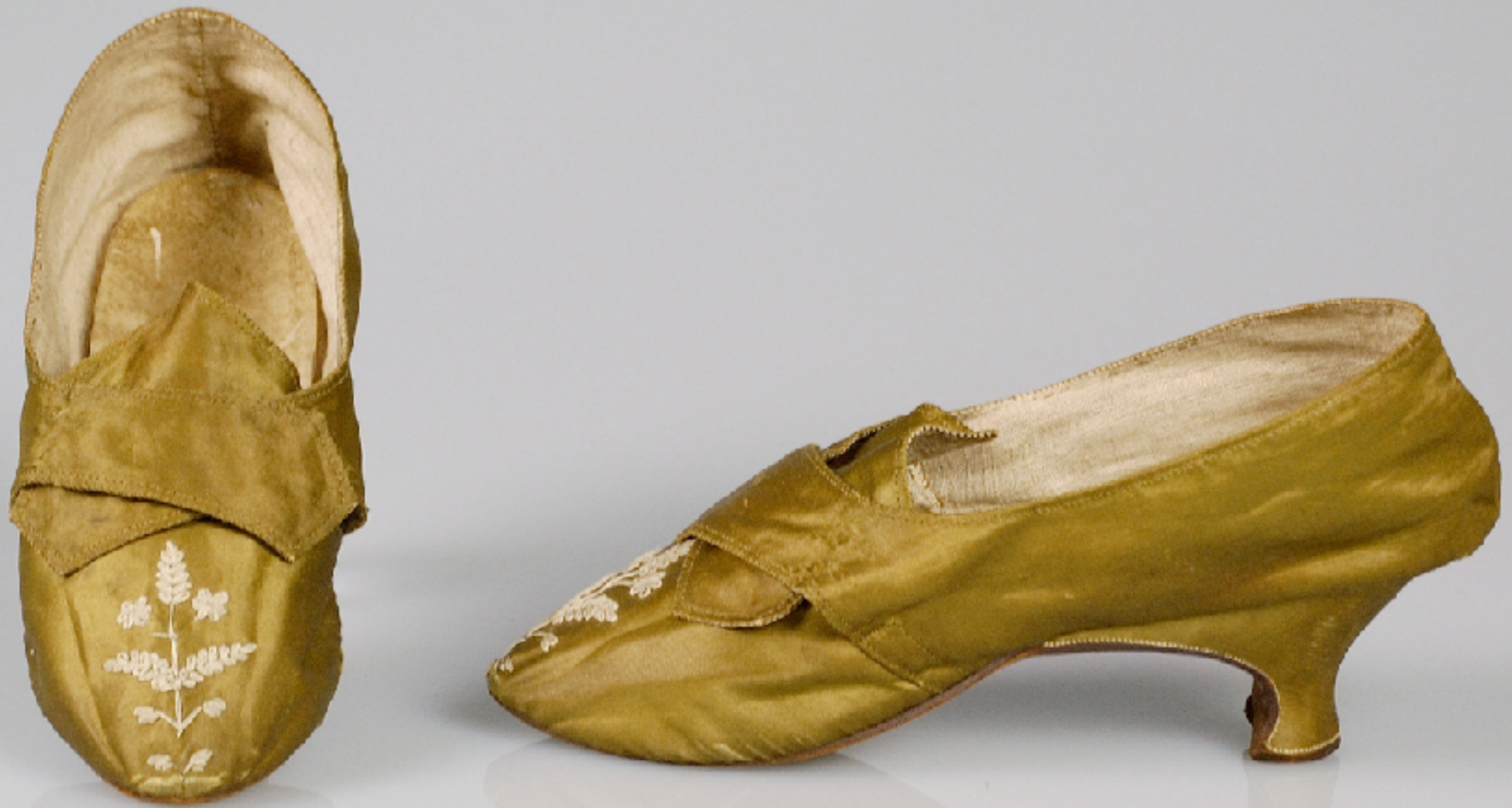
European Silk Buckle Shoes c. 1775 - 1785 (Metropolitan Museum of Art)