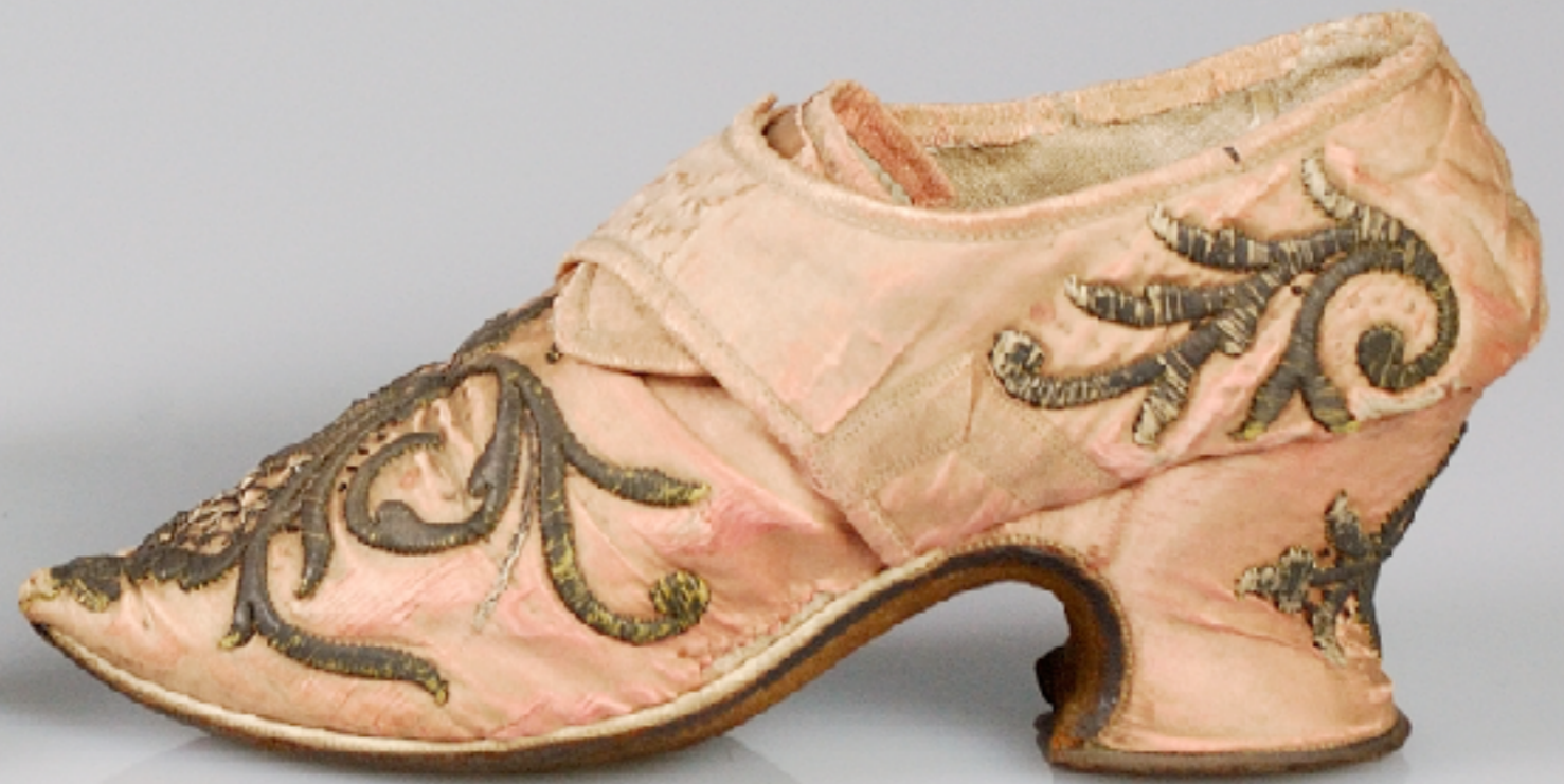
English Silk Buckle Shoes c. 1710 - 1749 (Metropolitan Museum of Art)