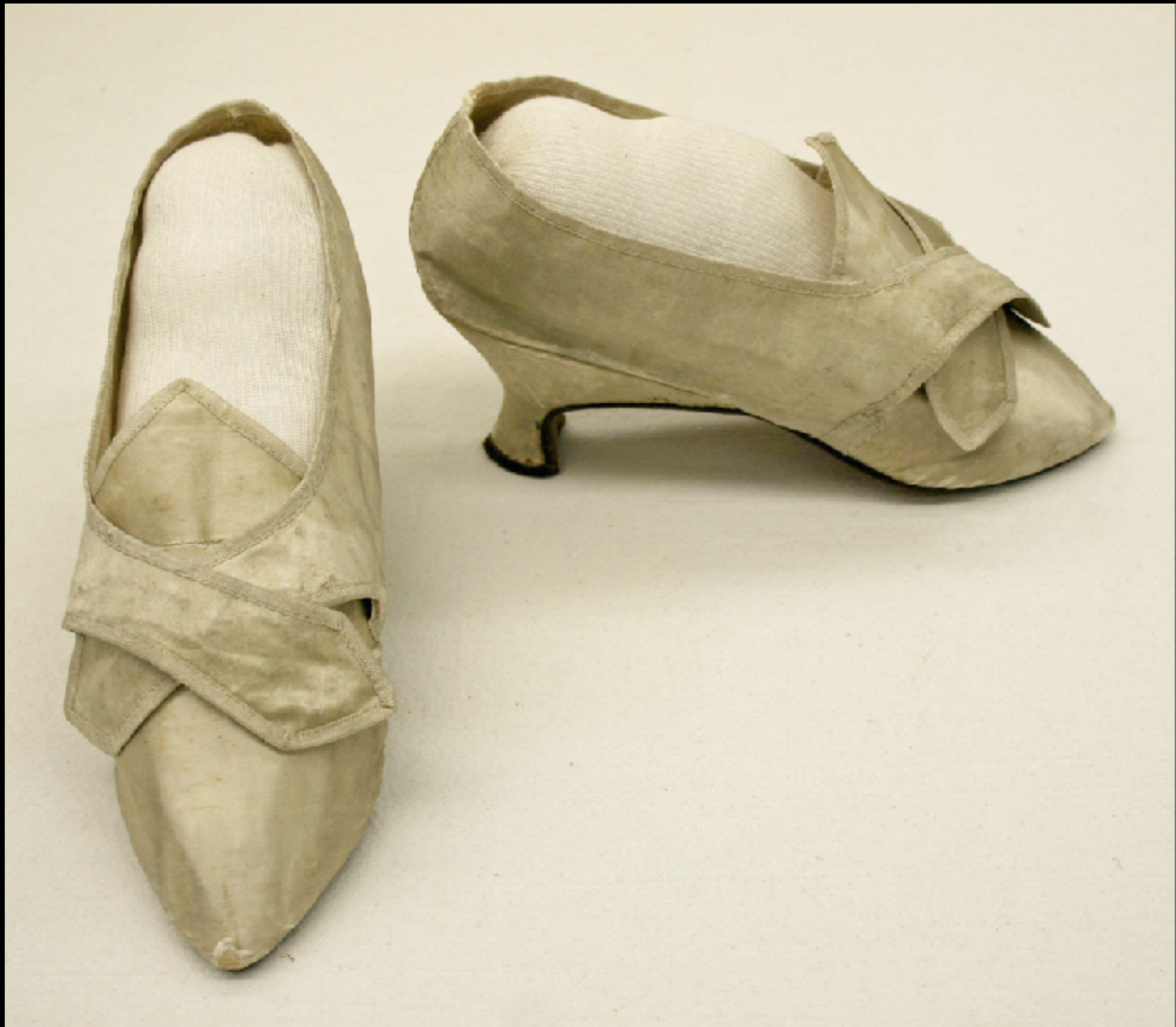
English Silk Buckle Shoes c. 1780 (Metropolitan Museum of Art)