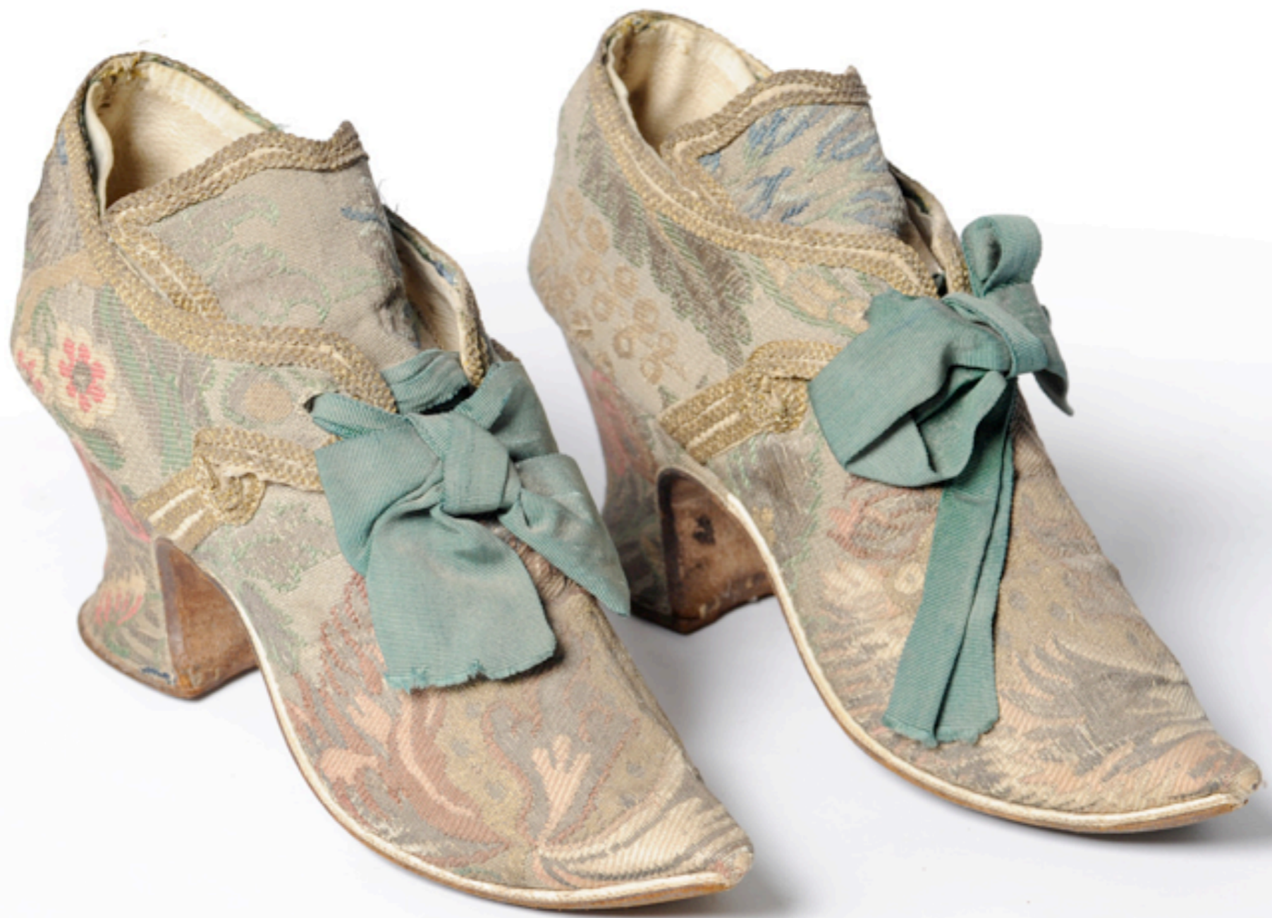
English Silk Brocade Tie Shoes