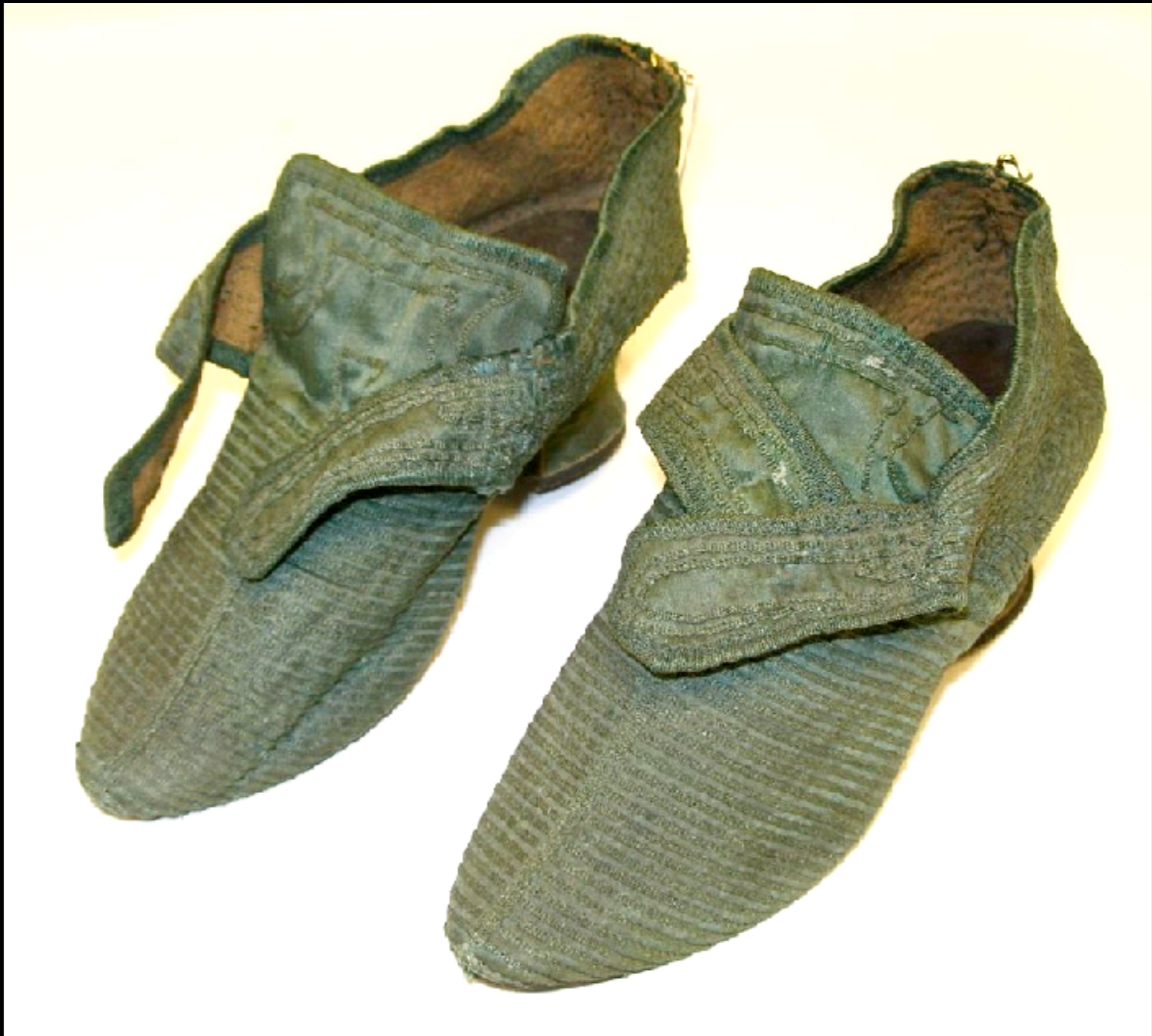
Green Silk Shoes