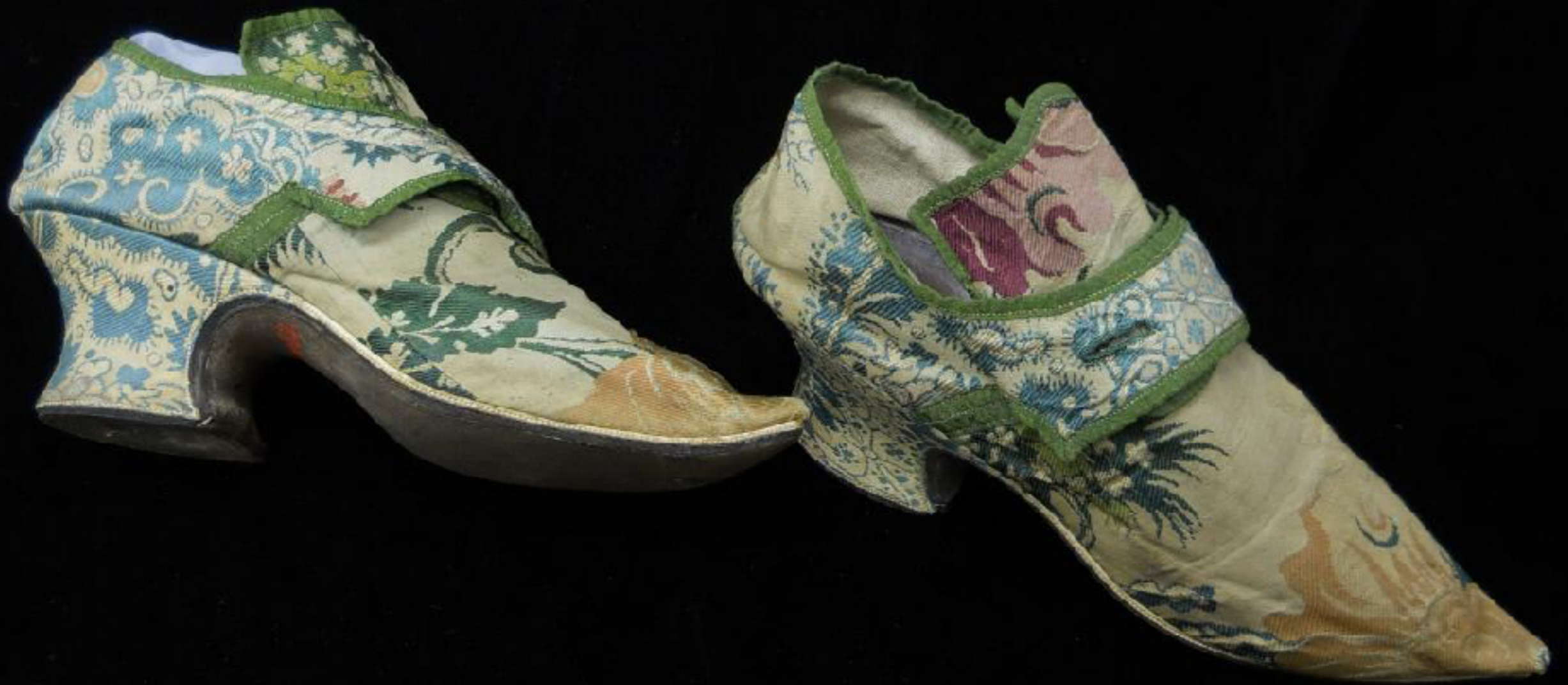
English Brocaded Silk Buckle Shoes c. 1720 - 1740