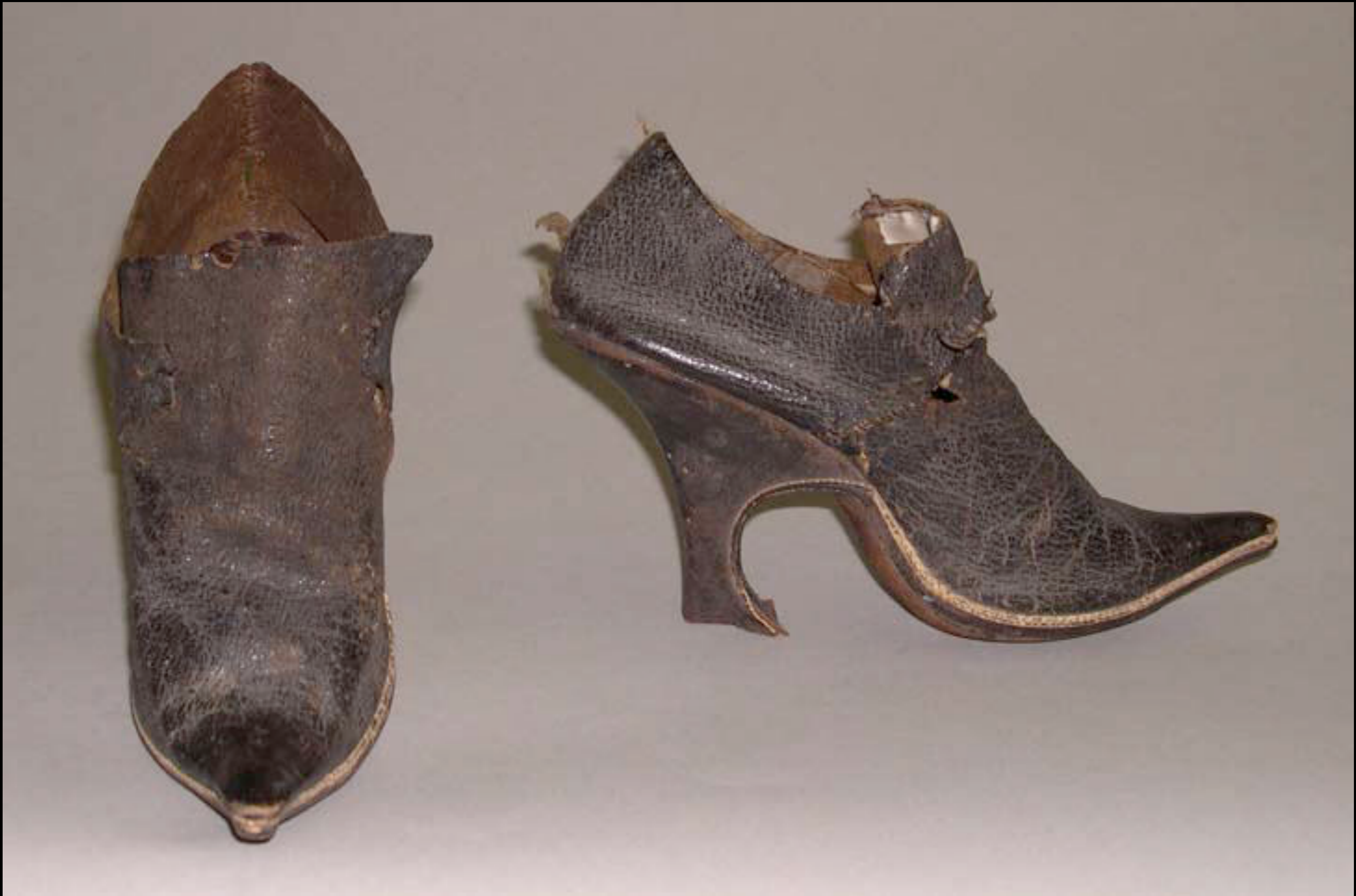
French Leather Shoes c. 1660 - 1760 (Metropolitan Museum of Art)