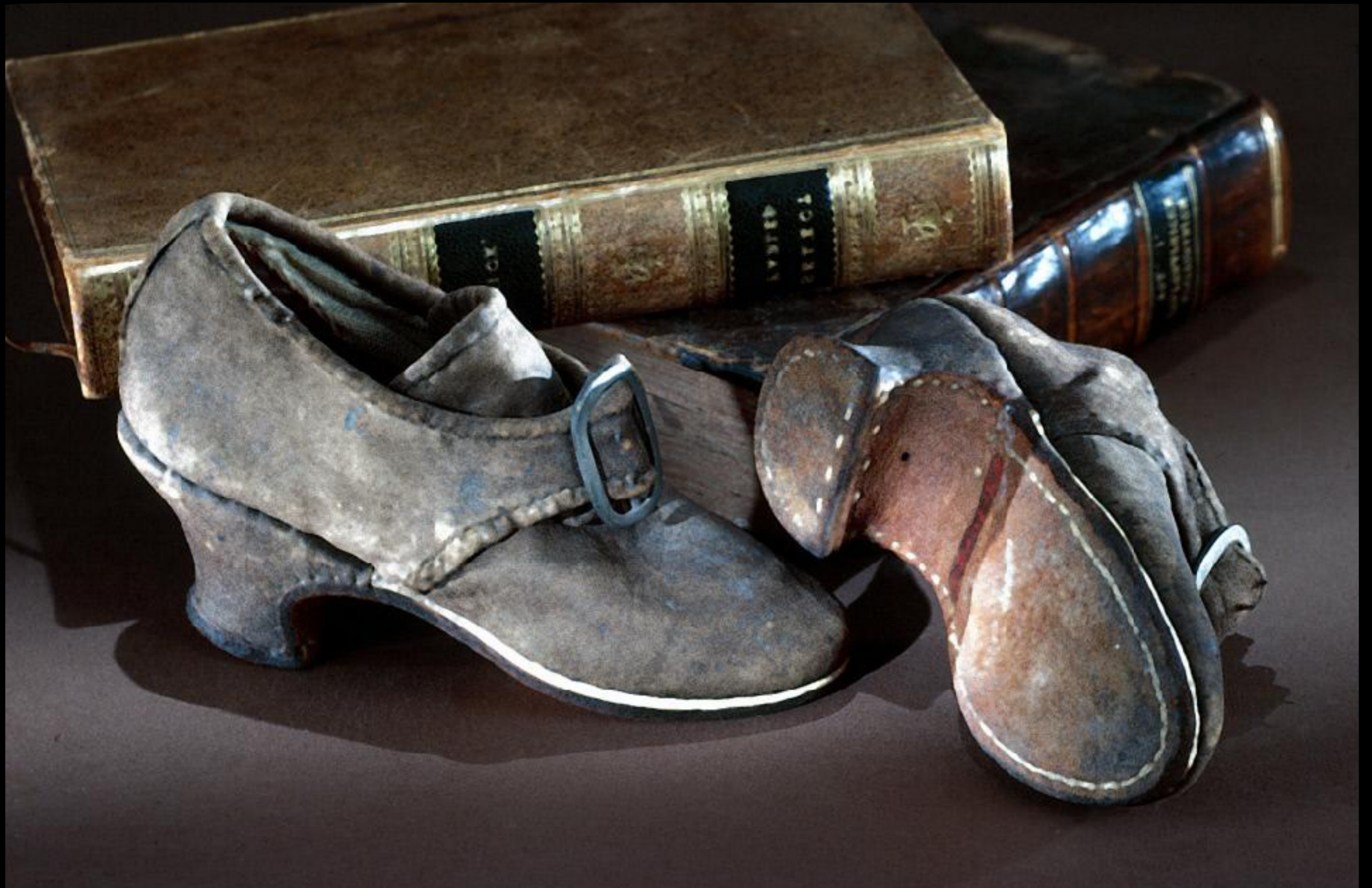
English or American Black or Brown Leather Girl's Buckle Shoes c. 1765 - 1785 (Colonial Williamsburg Foundation)