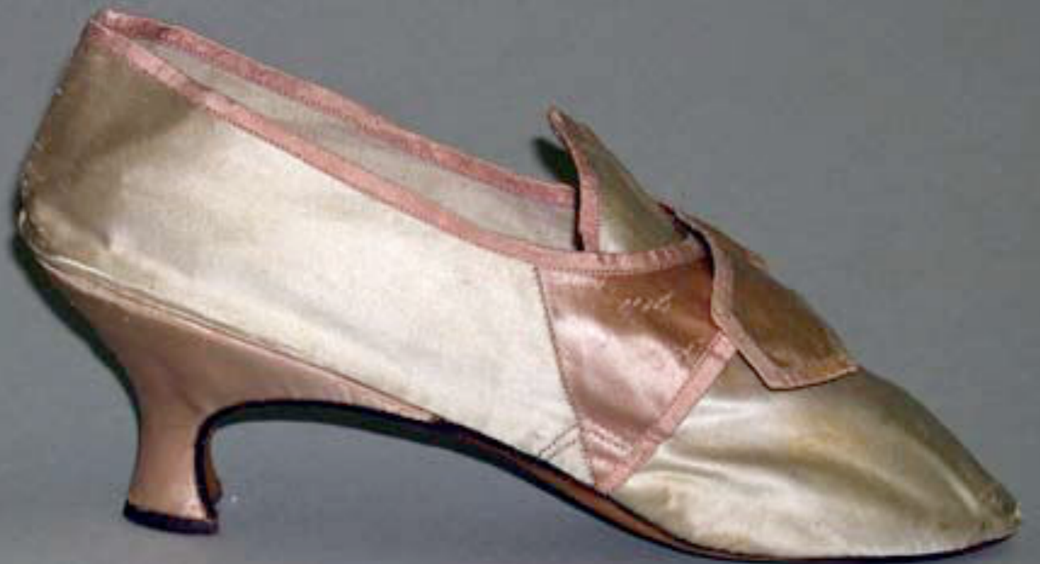
English Silk Buckle Shoes c. 1780 -1785 (Metropolitan Museum of Art)