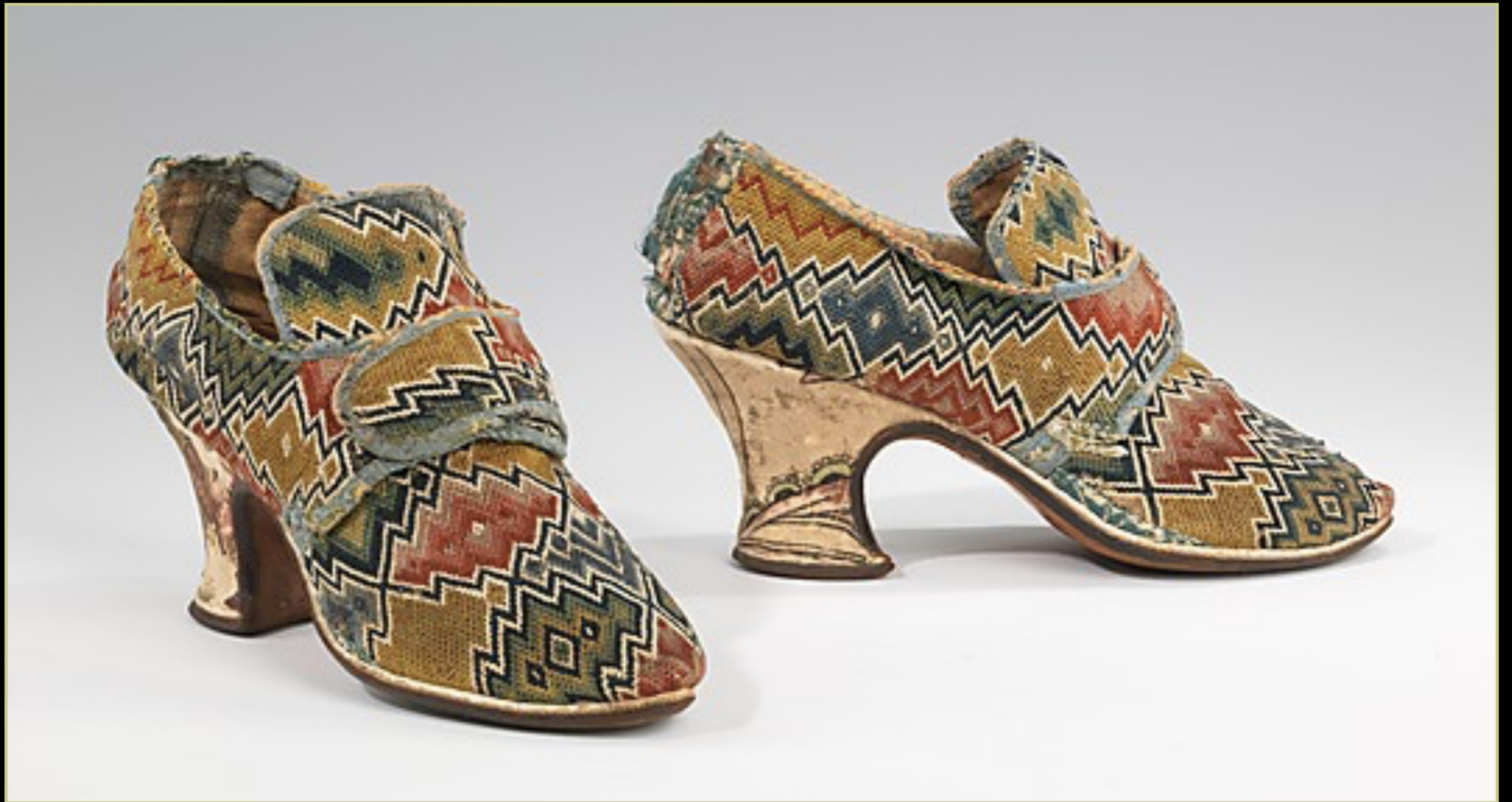
English Irish Stitch Wool Buckle Shoes c. 1750 - 1769 (Metropolitan Museum of Art)