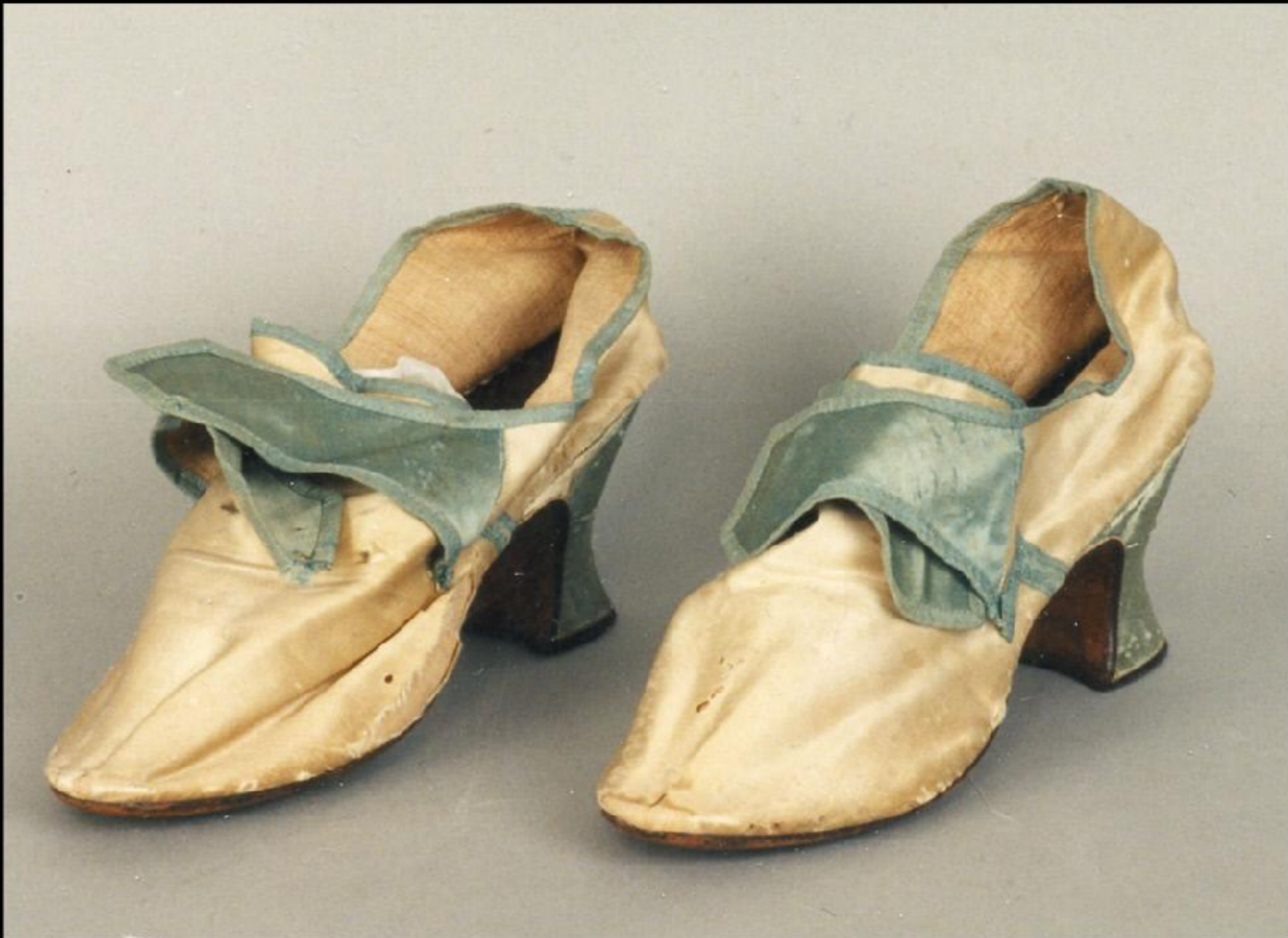
English Satin Buckle Shoes Worn in Maryland by a Member of the Ringgold Family by Hose & Spier c. 1775 - 1785