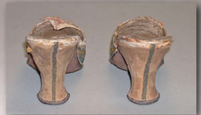
European Silk Mules or Backless Slippers c. 1710 - 1729 (Metropolitan Museum of Art)