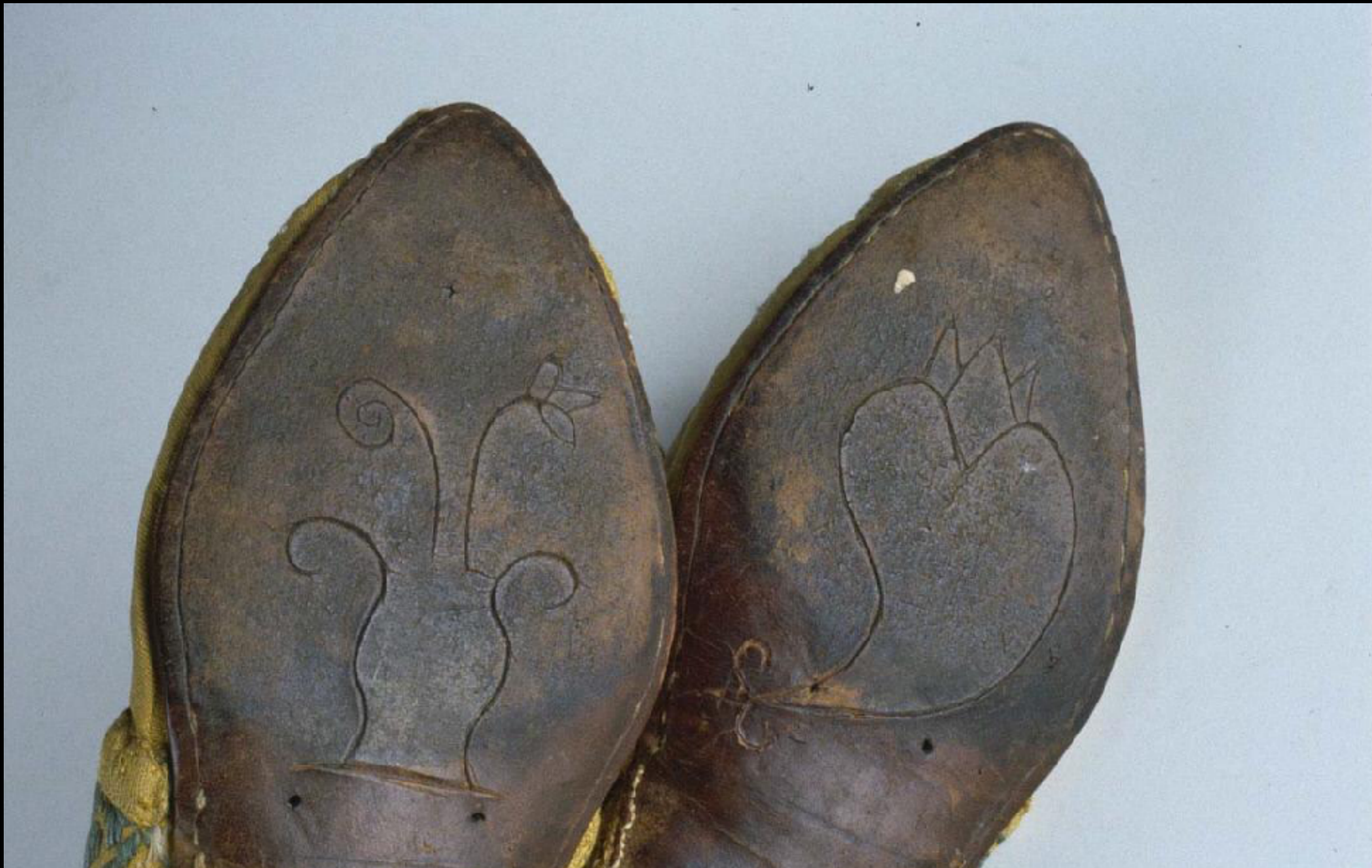
German or Dutch Brocaded Silk Buckle Shoes