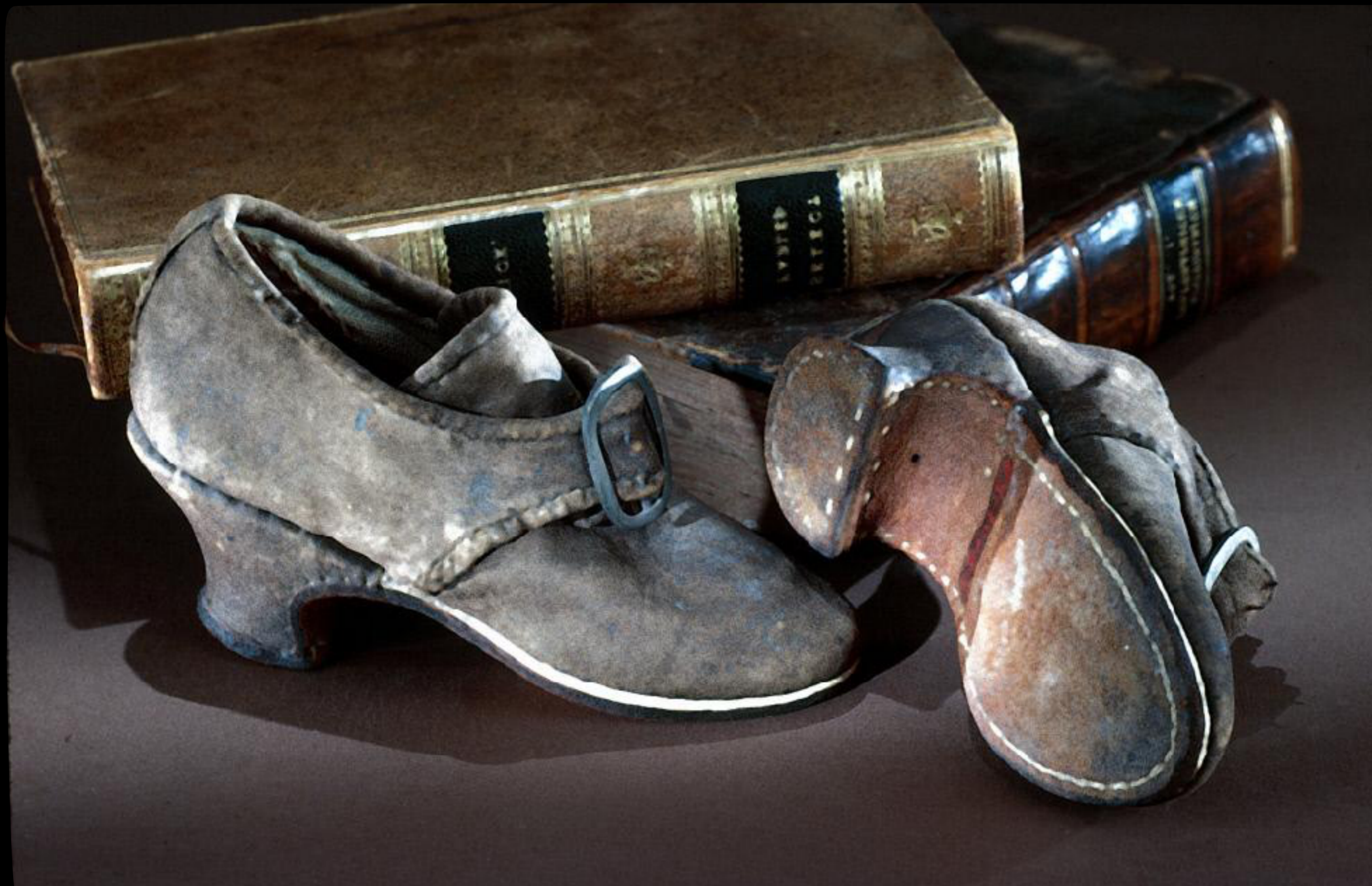
American or English Sueded Leather Girl Shoes or Window Displays c. 1765 - 1785 (Colonial Williamsburg Foundation)