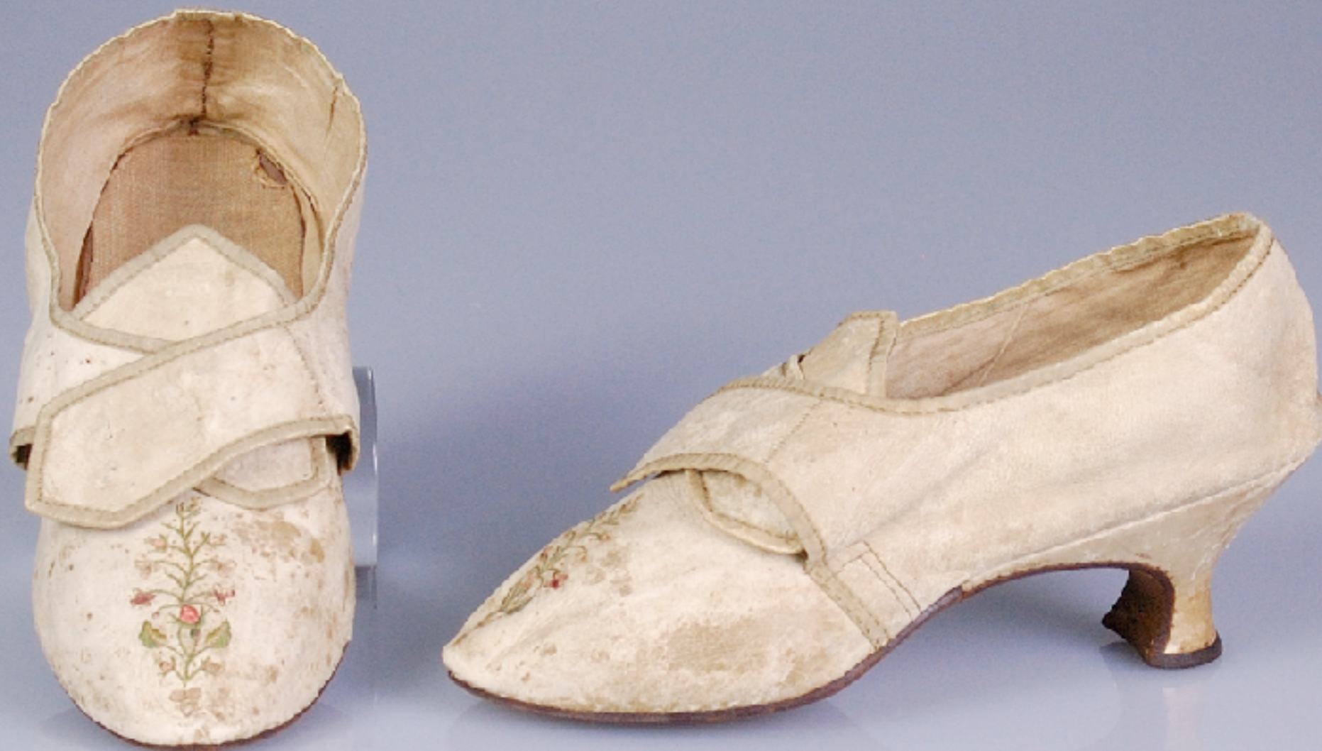
French Silk Buckle Shoes 3rd Quarter 18th Century (Metropolitan Museum of Art)