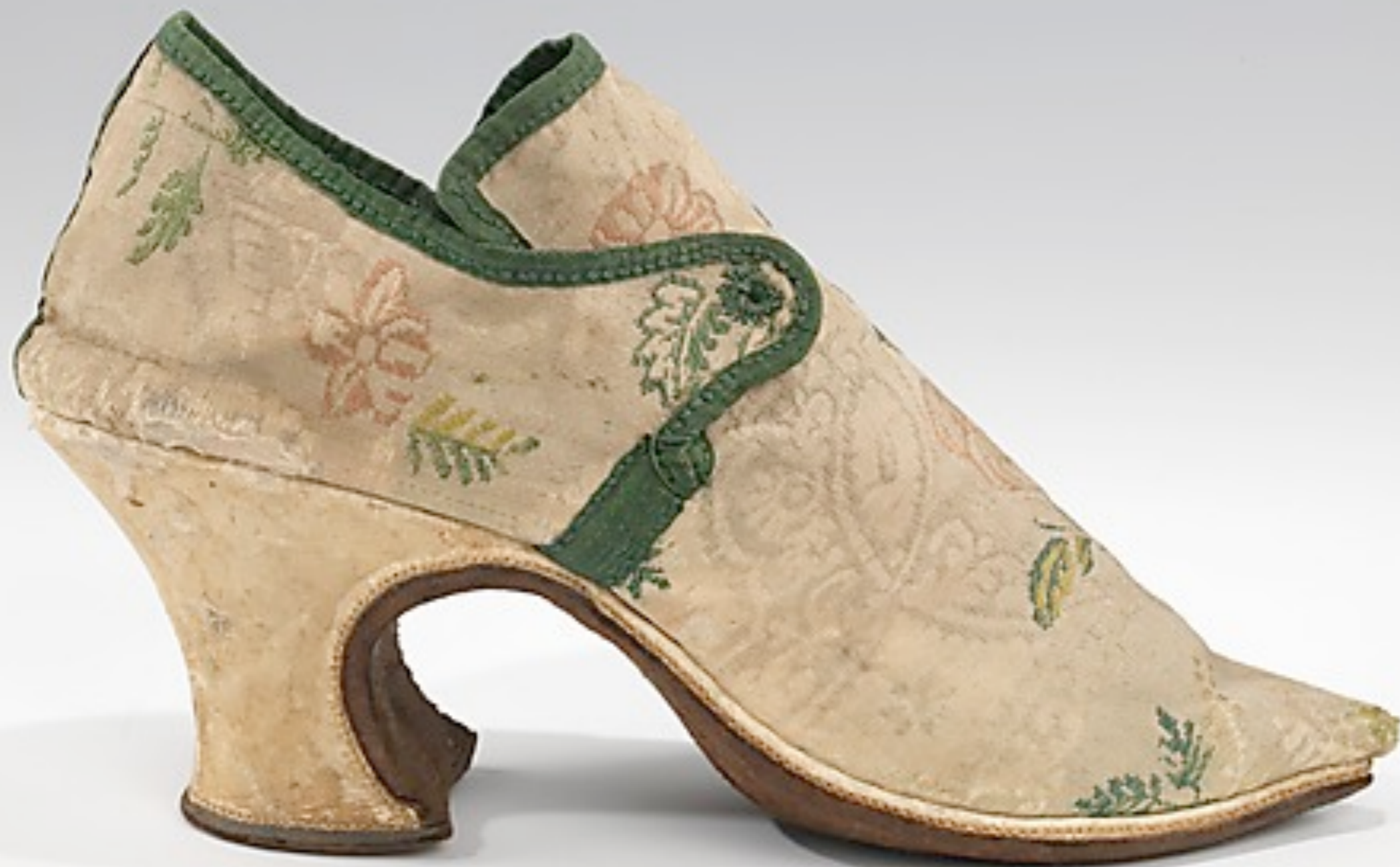
English Silk Tie Shoes c. 1700 - 1720 (Metropolitan Museum of Art)