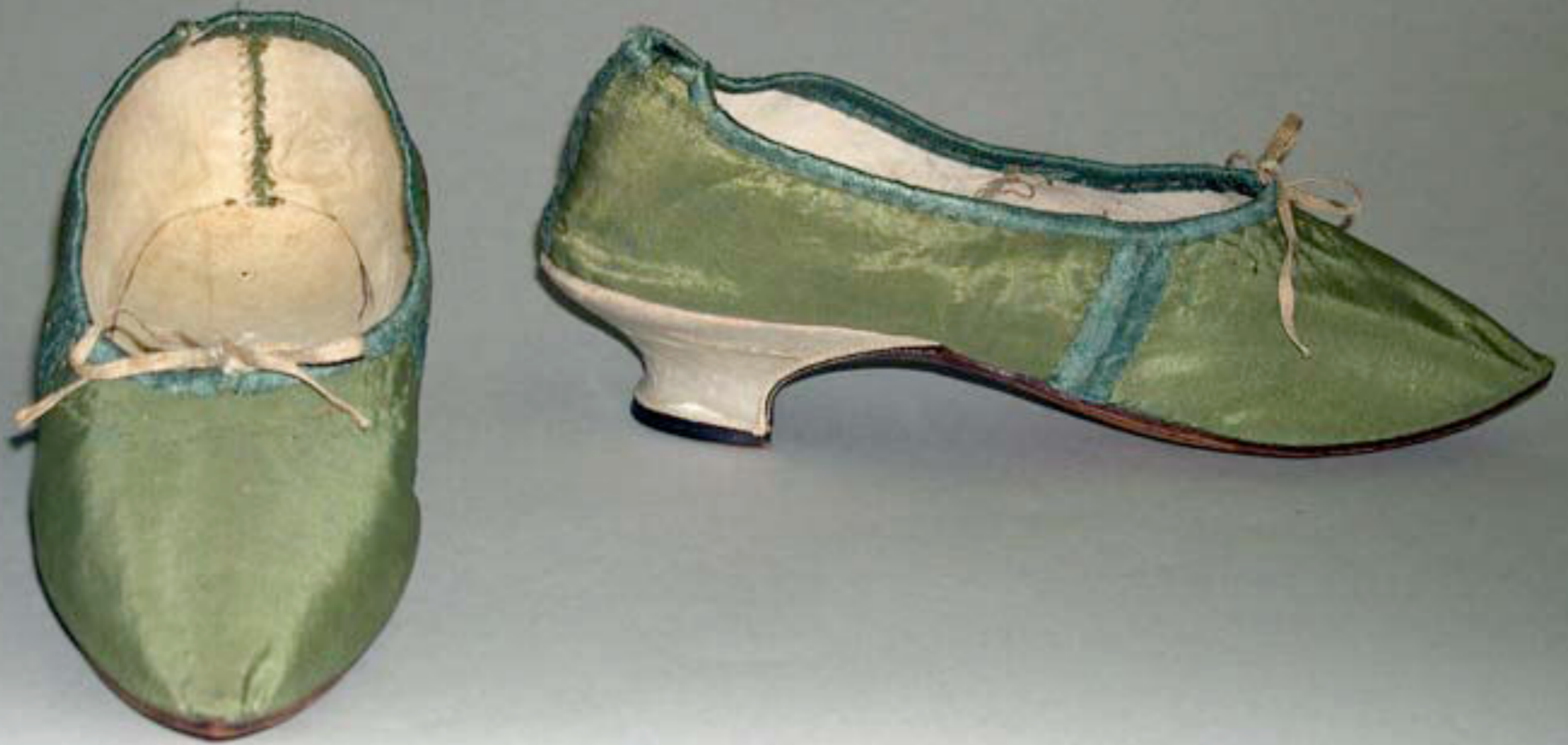
European Silk Slipper Shoes c. 1770 - 1789 (Metropolitan Museum of Art)