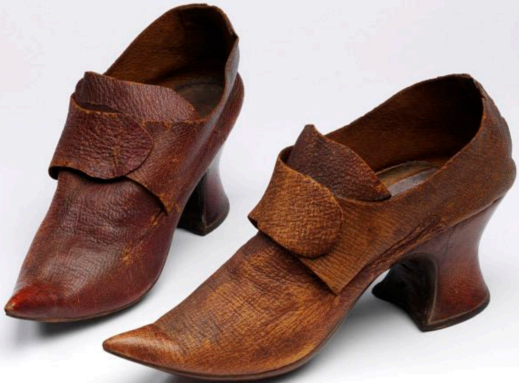
English Leather Buckle Shoes c. 1700 - 1720 (Metropolitan Museum of Art)