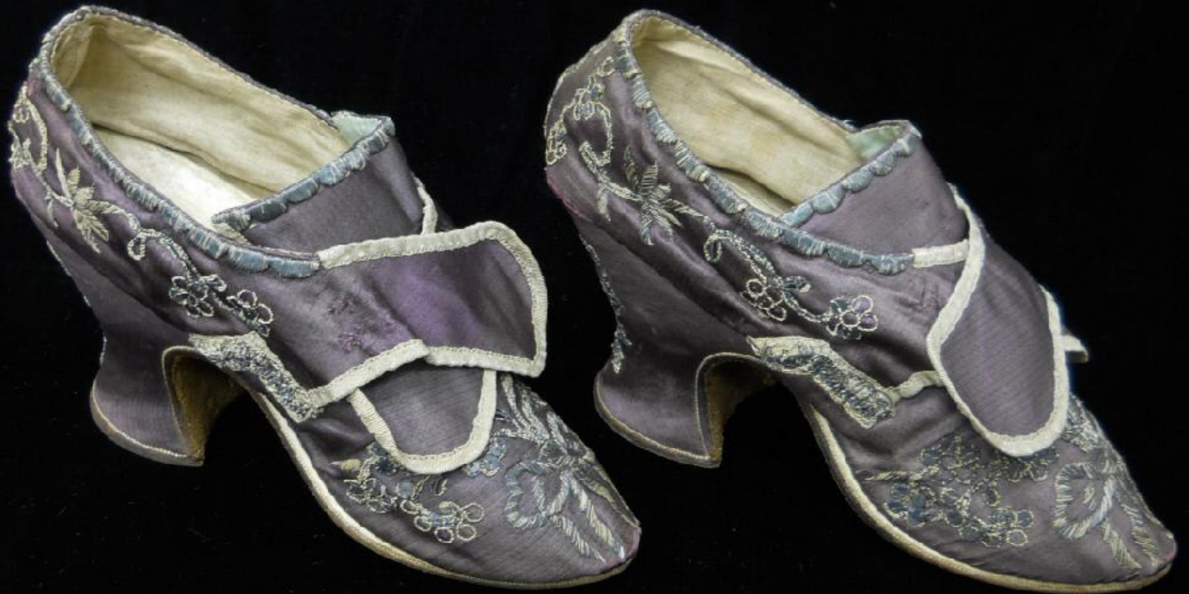
European Silk Buckle Shoes c. 1760 - 1769 (Colonial Williamsburg Foundation)