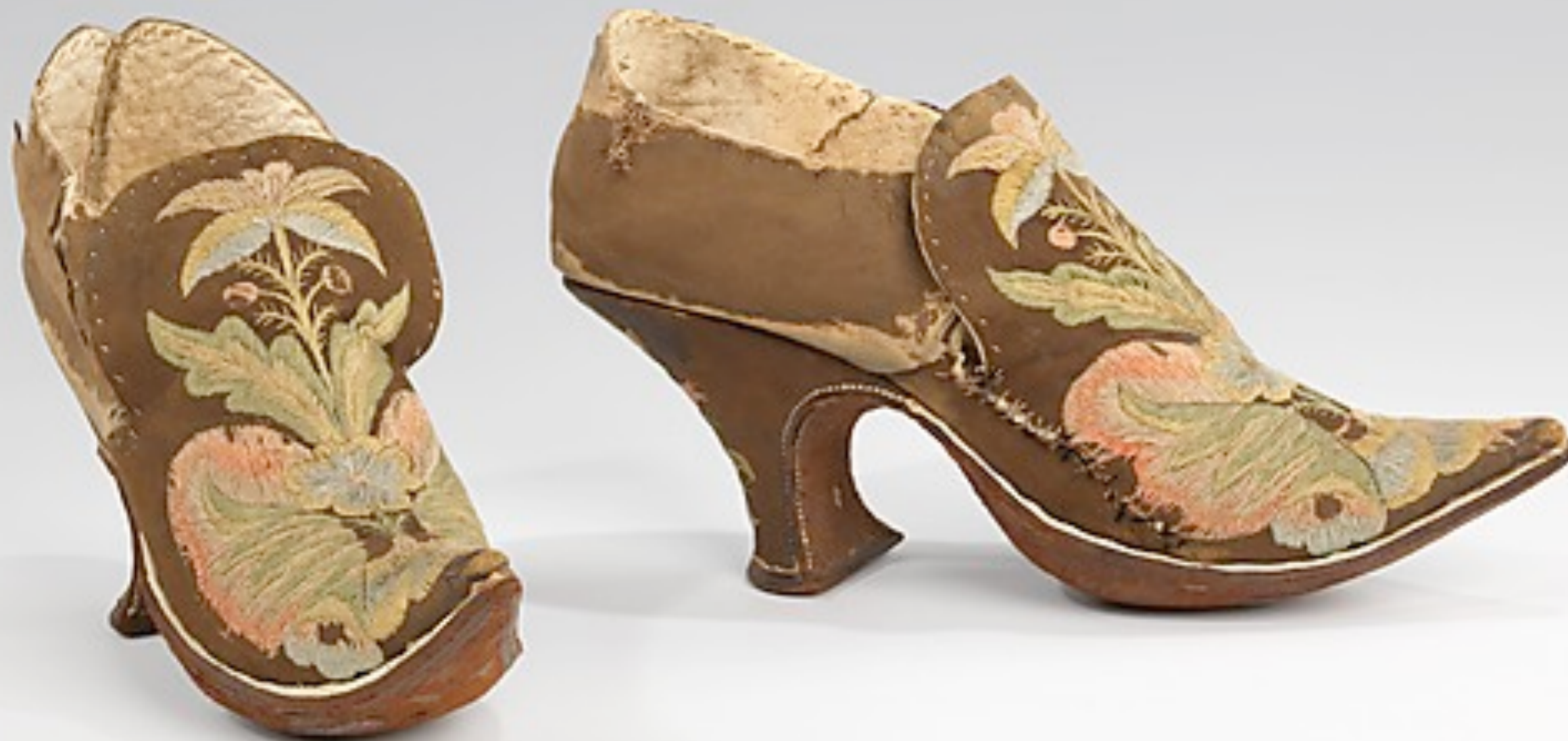
European Silk Shoes c. 1690 - 1710 (Metropolitan Museum of Art)