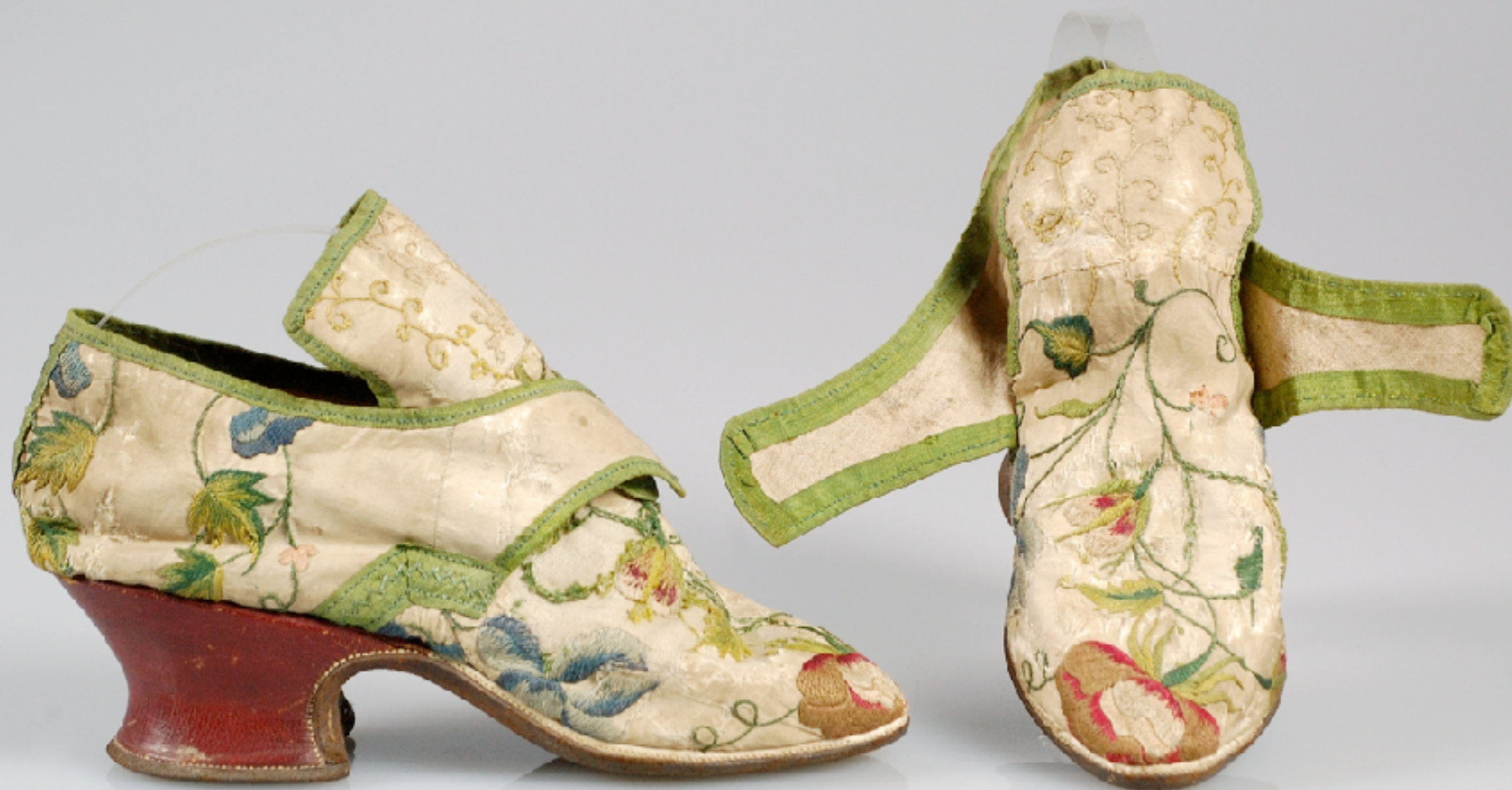
English Silk Buckle Shoes c. 1740 - 1789 (Metropolitan Museum of Art)