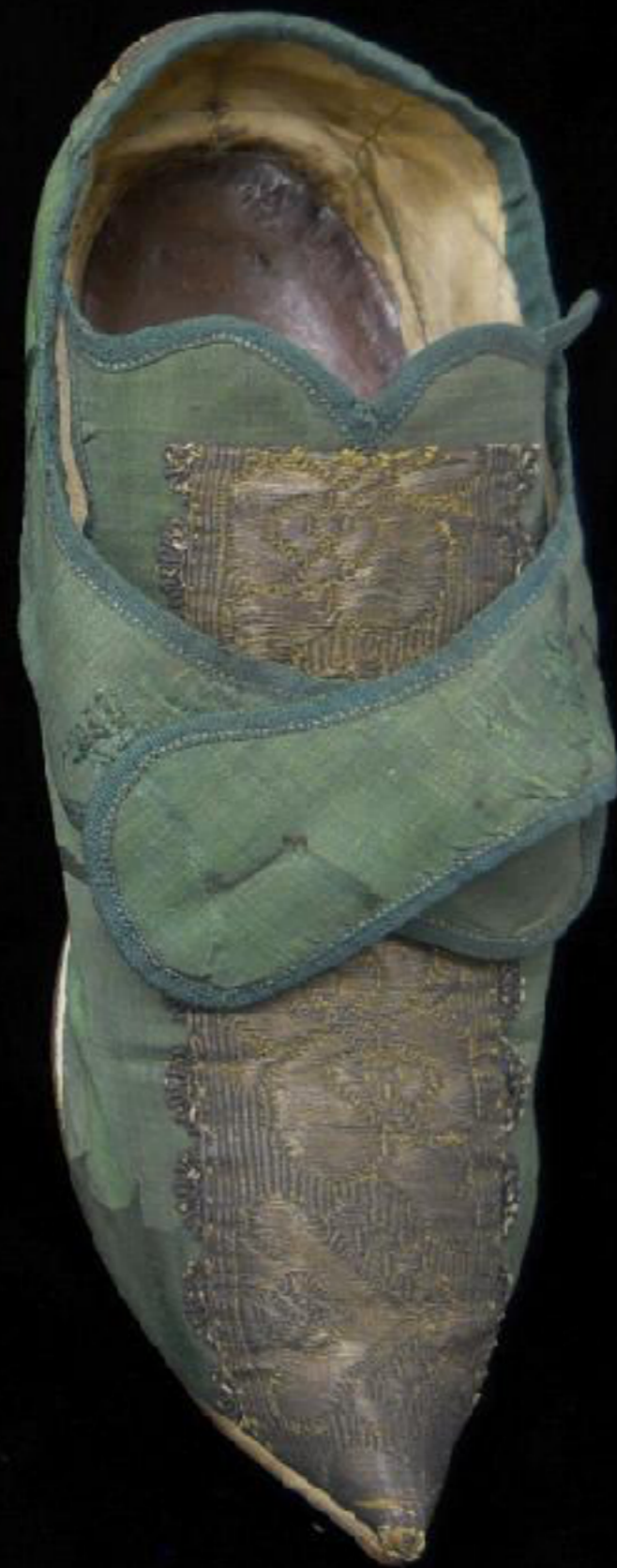
English Silk Damask Buckle Shoes c. 1730 - 1750 (Colonial Williamsburg Foundation)