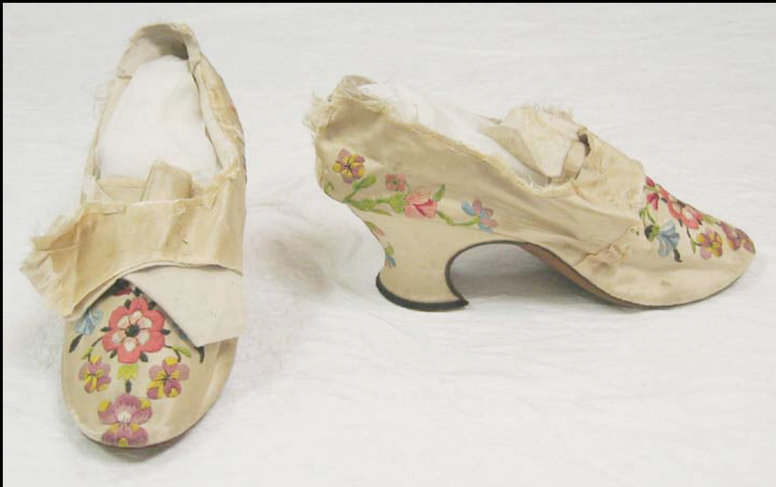
English Silk Buckle Shoe 18th Century (Metropolitan Museum of Art)