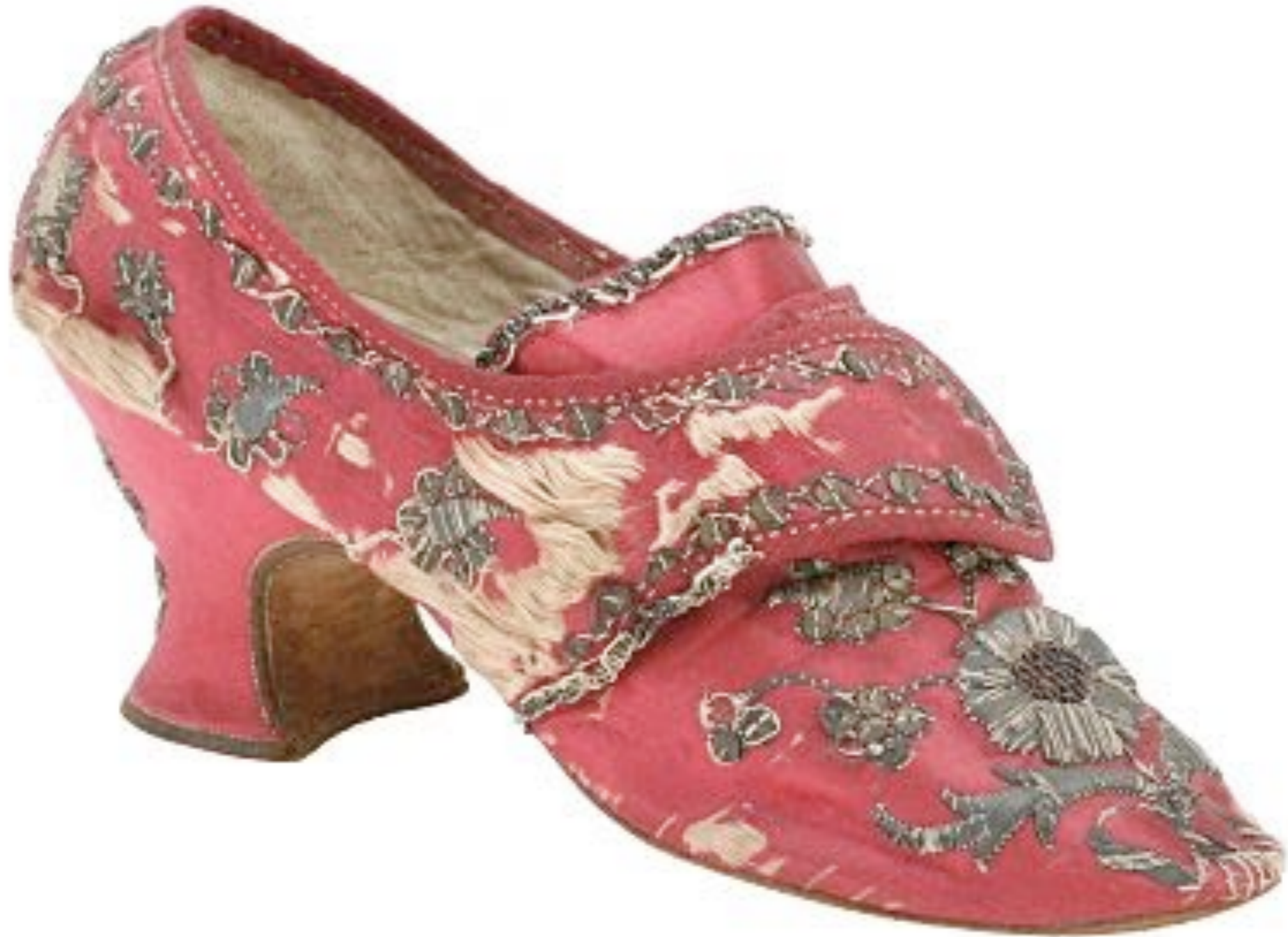
Silk Buckle Shoe Mid 18th Century (Private Collection)