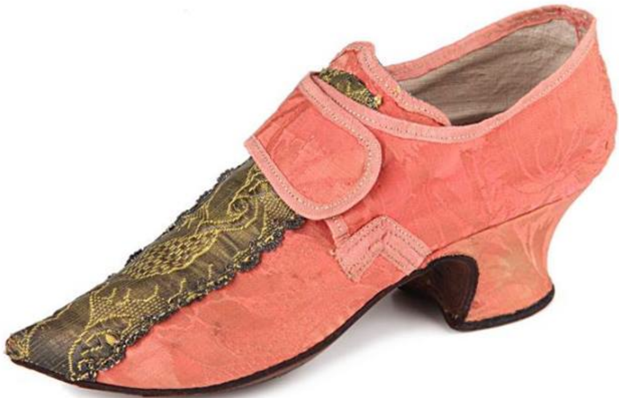
English Metallic Lace & Pink Silk Damask Buckle Shoe