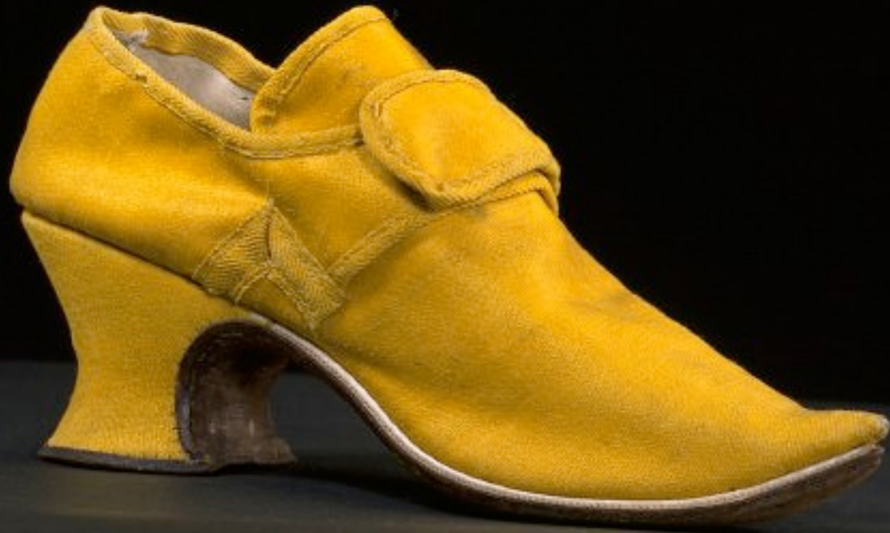
English Worsted Wool Buckle Shoe from Norwich