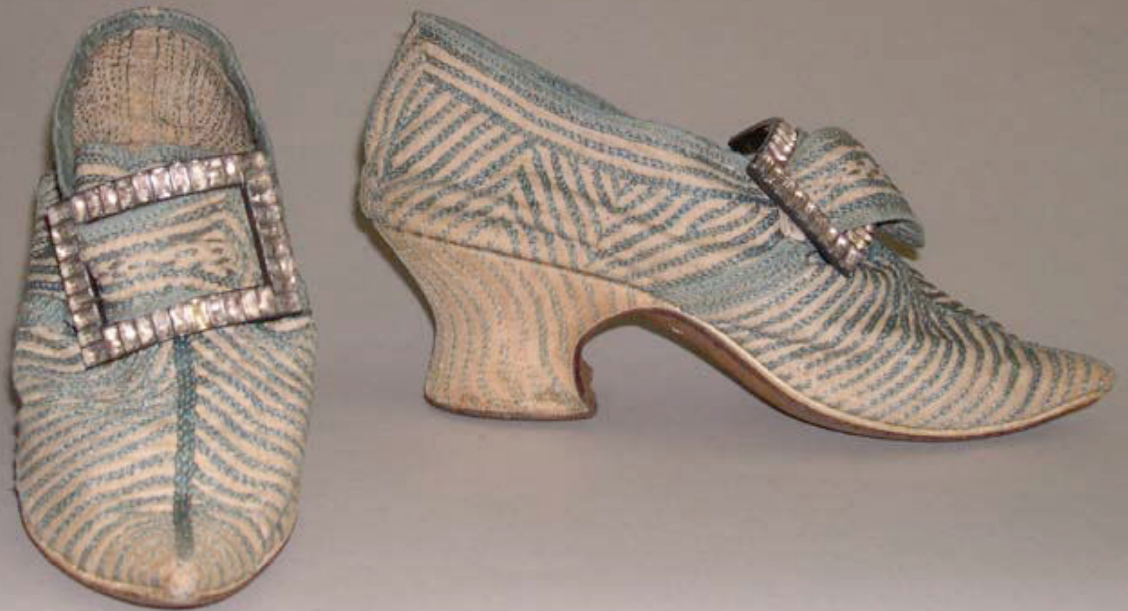
English Linen, Silk & Leather Buckle Shoes c. 1740 - 1749 (Metropolitan Museum of Art)