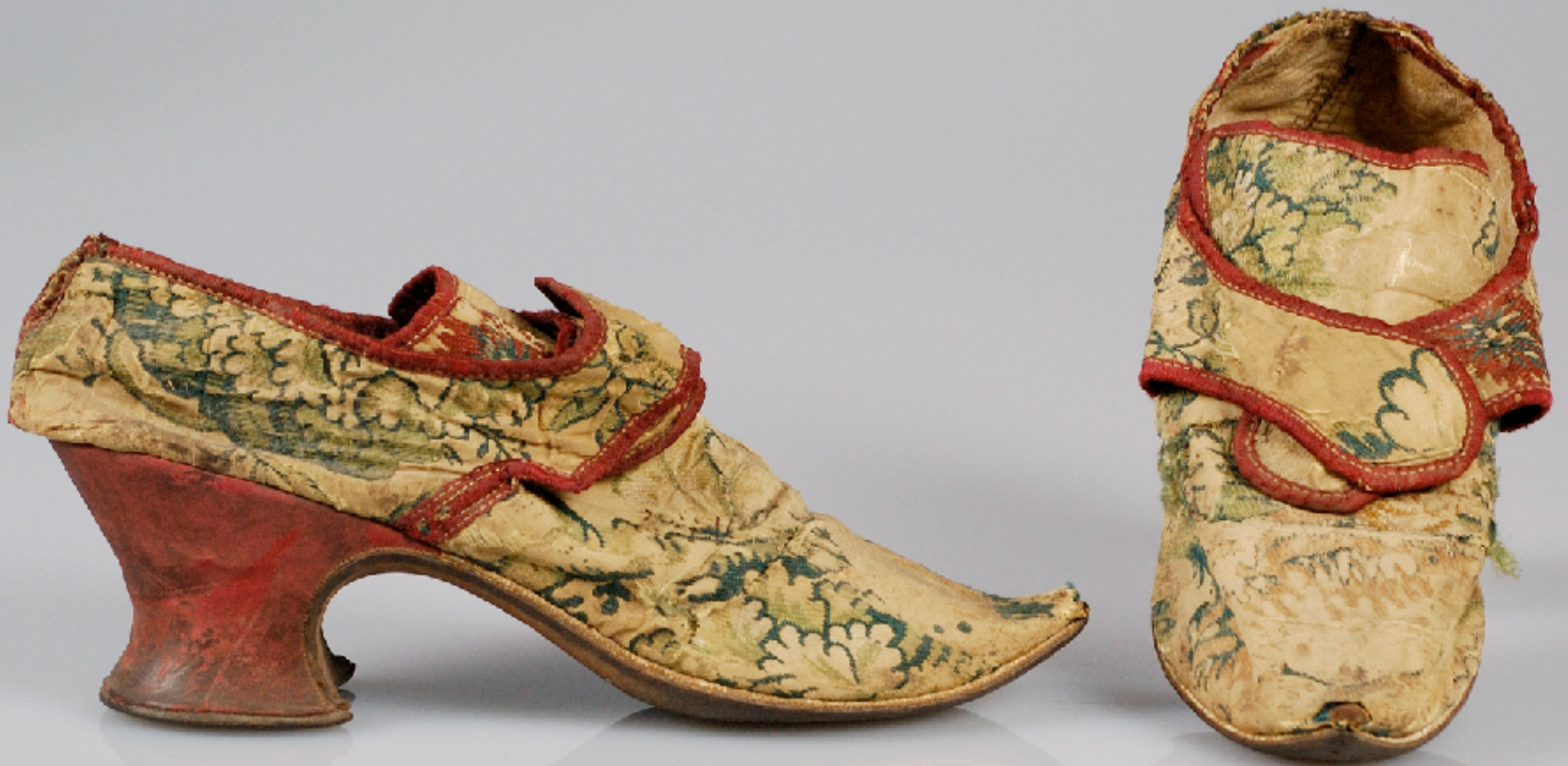
English Silk Buckle Shoes c. 1735 - 1745 (Metropolitan Museum of Art)