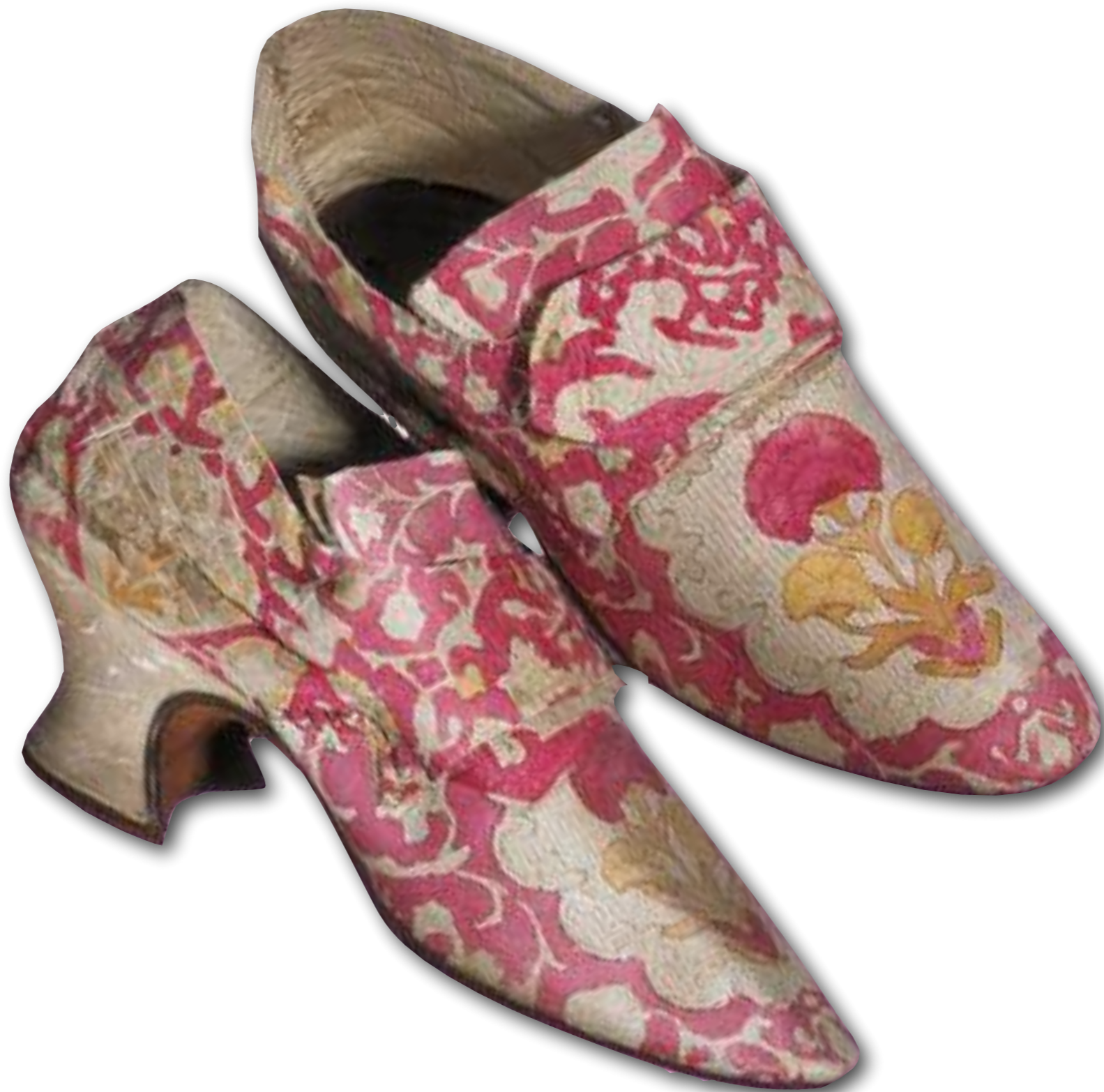
Painted Kid Leather Shoes, Possibly from Brussels