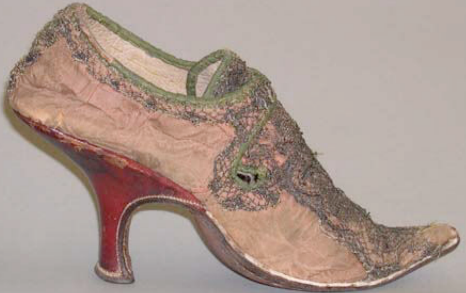
French Silk Tie Shoes c. 1720 - 1739 (Metropolitan Museum of Art)