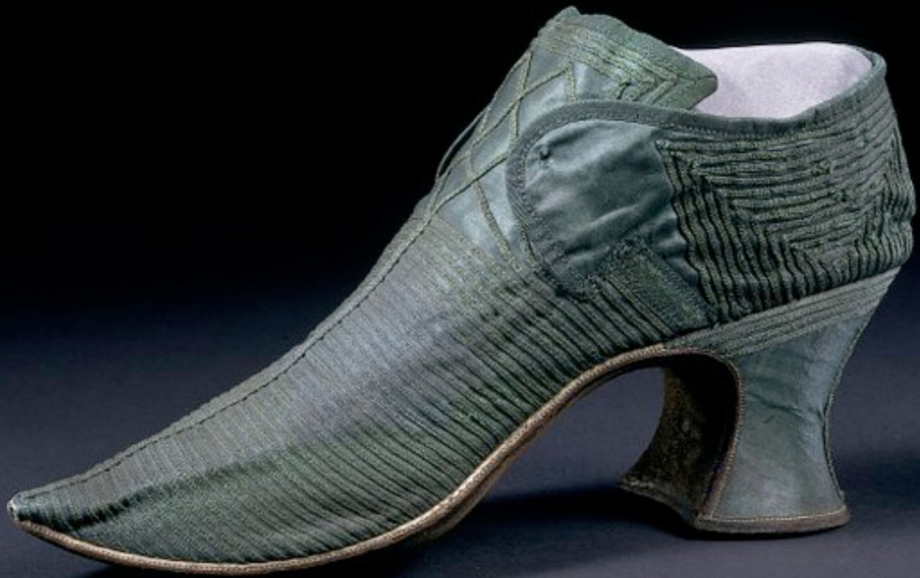
English Satin Tie Shoe c. 1710 (Victoria & Albert)