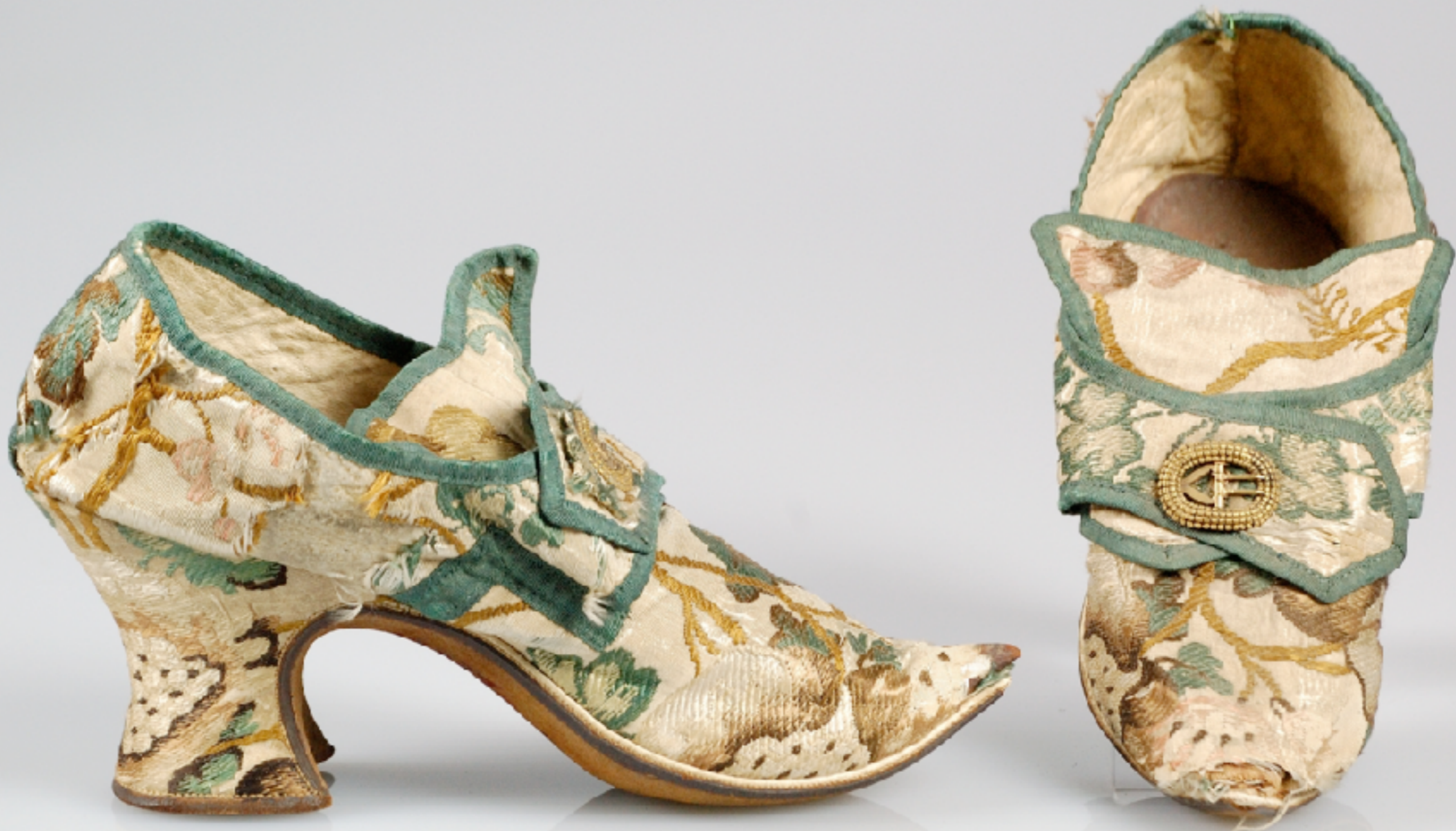
English Silk Buckle Shoes c. 1710 - 1729 (Metropolitan Museum of Art)