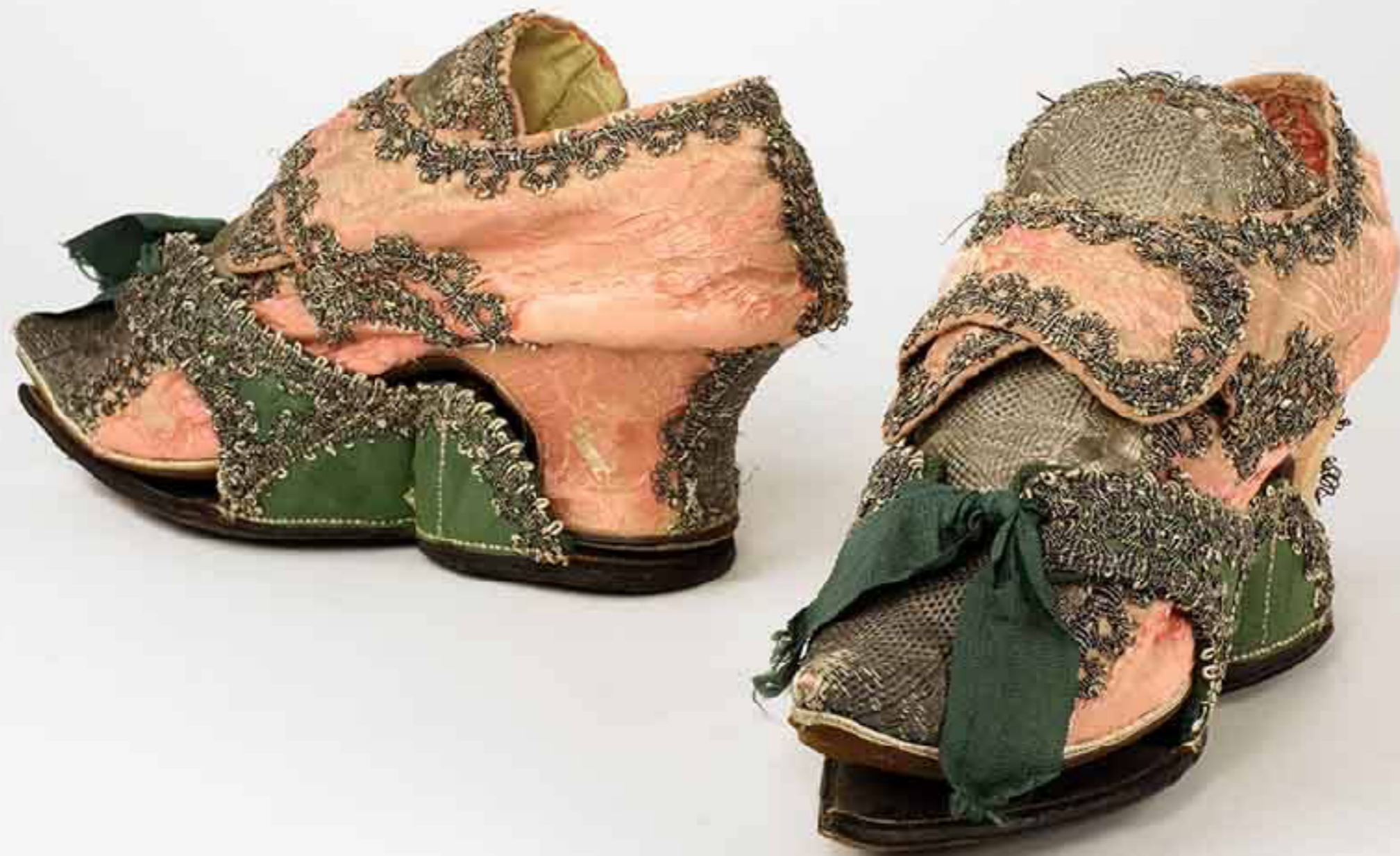
English Metallic Lace & Silk Buckle Shoes with Pattens