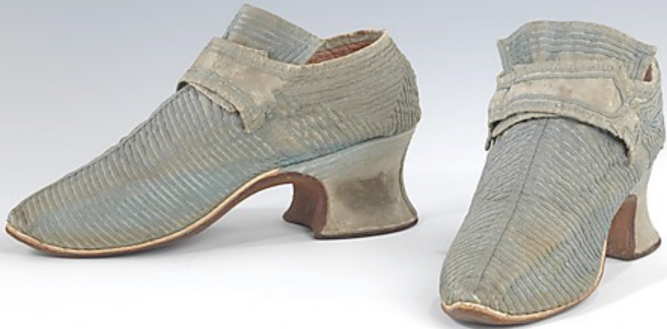
European Silk Buckle Shoes c. 1730 - 1759 (Metropolitan Museum of Art)