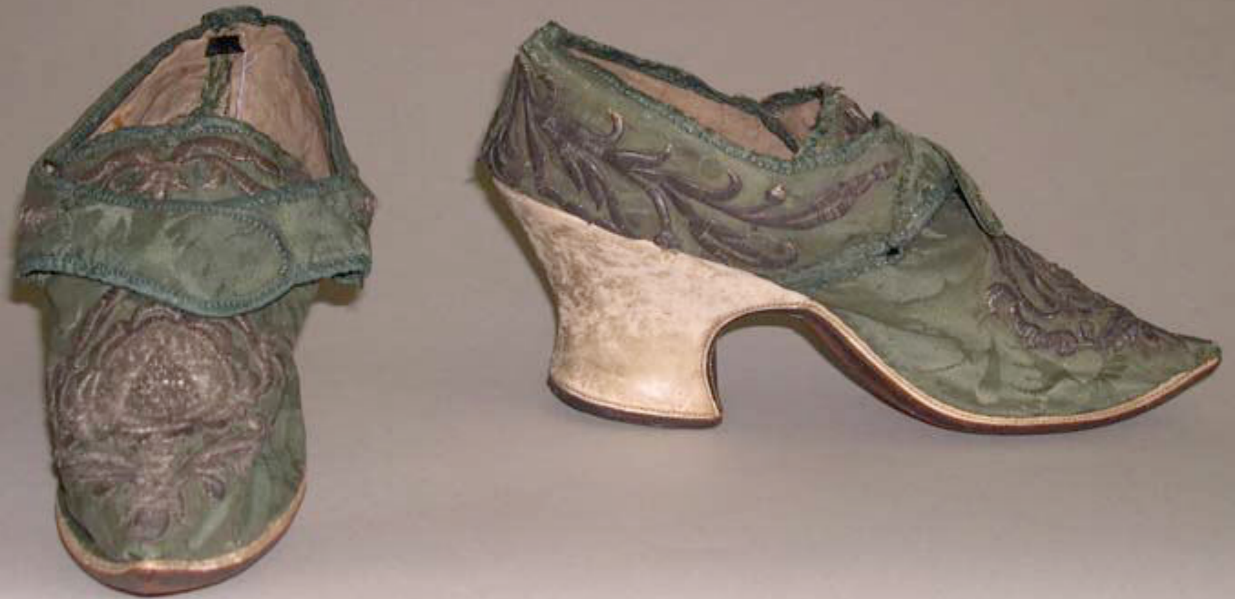
English Silk Buckle Shoes c. 1720 - 1739 (Metropolitan Museum of Art)