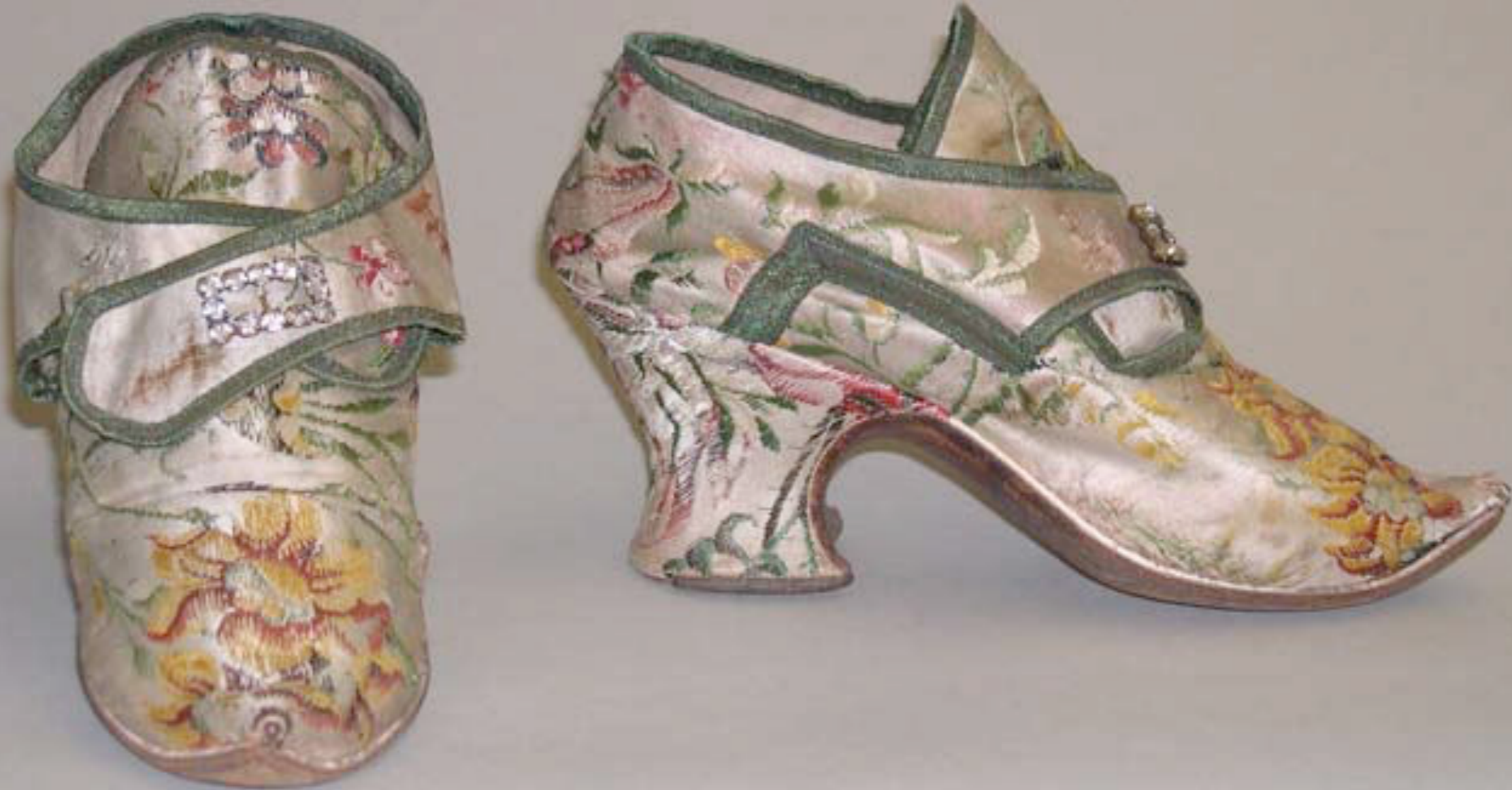
English Silk Buckle Shoes Early 18th Century (Metropolitan Museum of Art)