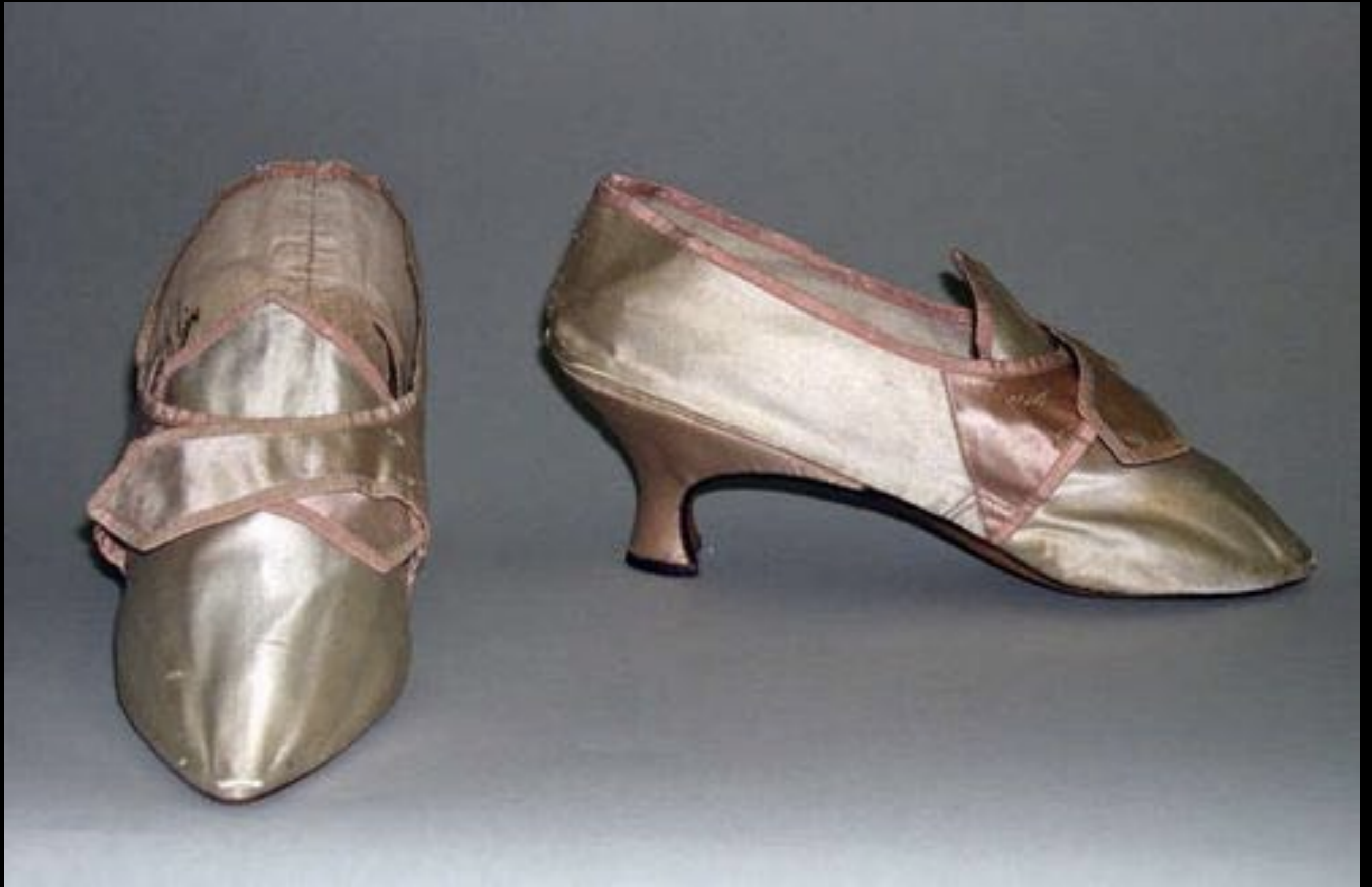
Silk Buckle Shoes c. 1770 - 1789 (Metropolitan Museum of Art)