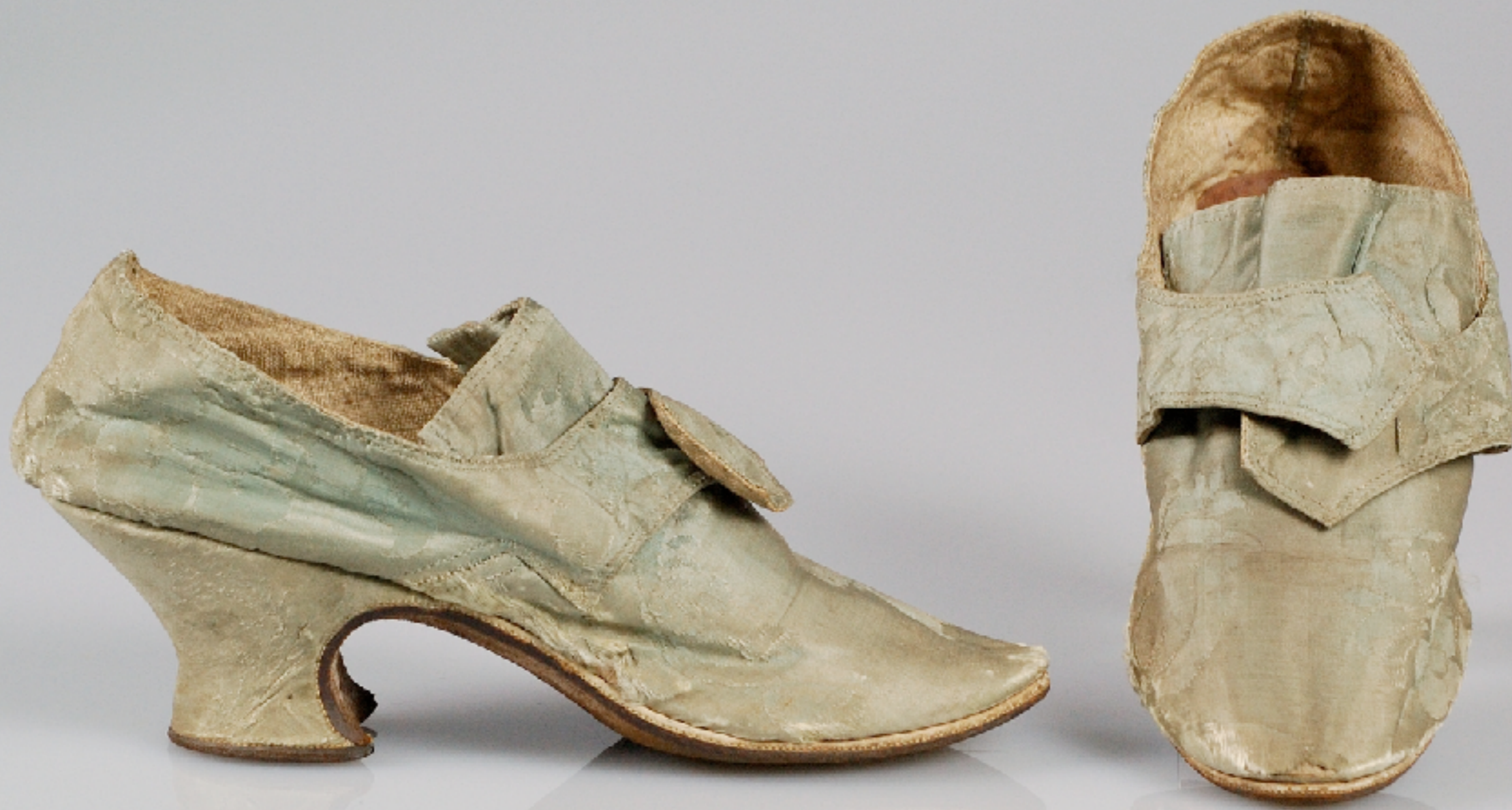
English Silk Buckle Shoes c. 1740 - 1760 (Metropolitan Museum of Art)