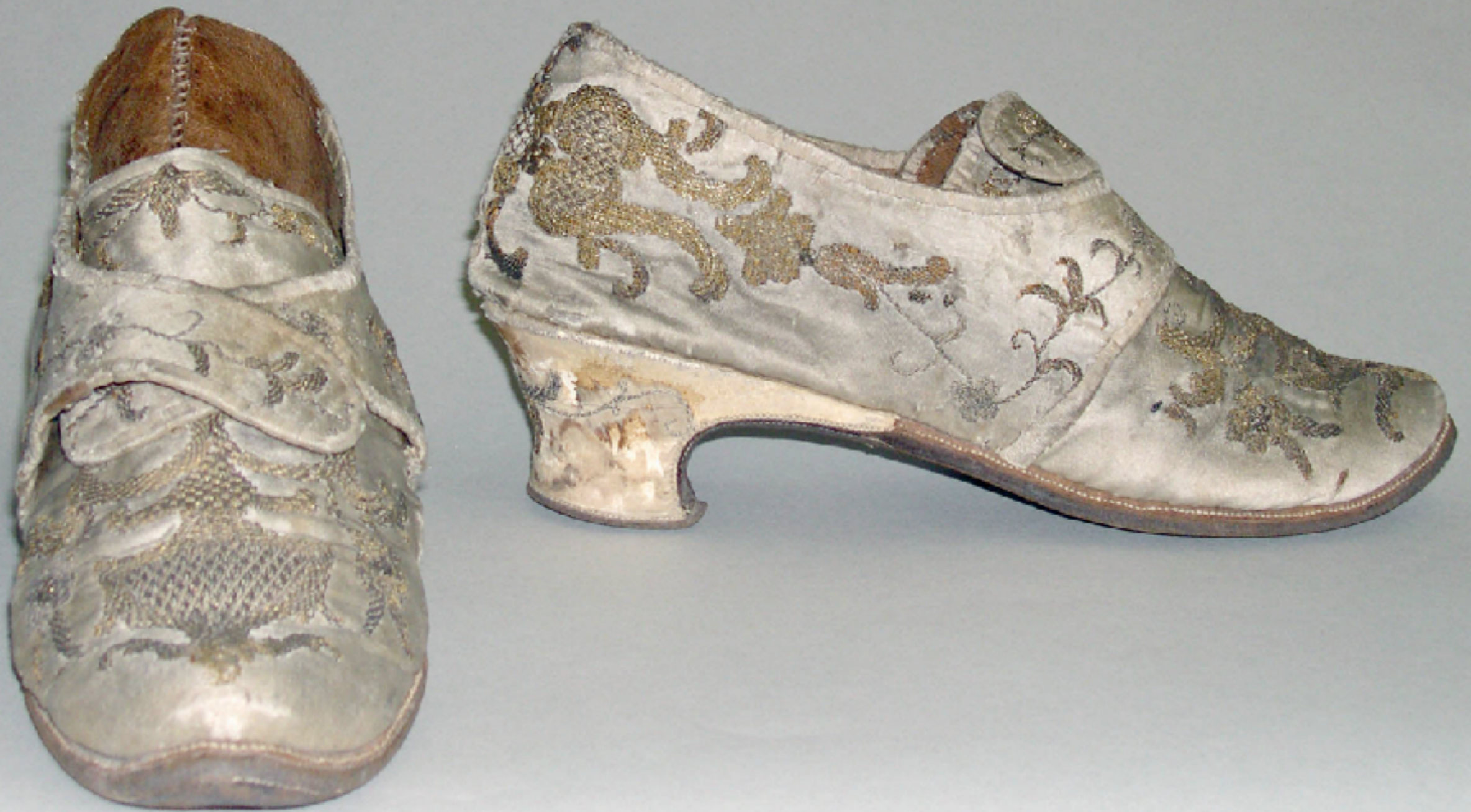
European Silk Buckle Shoes c. 1720 - 1749 (Metropolitan Museum of Art)