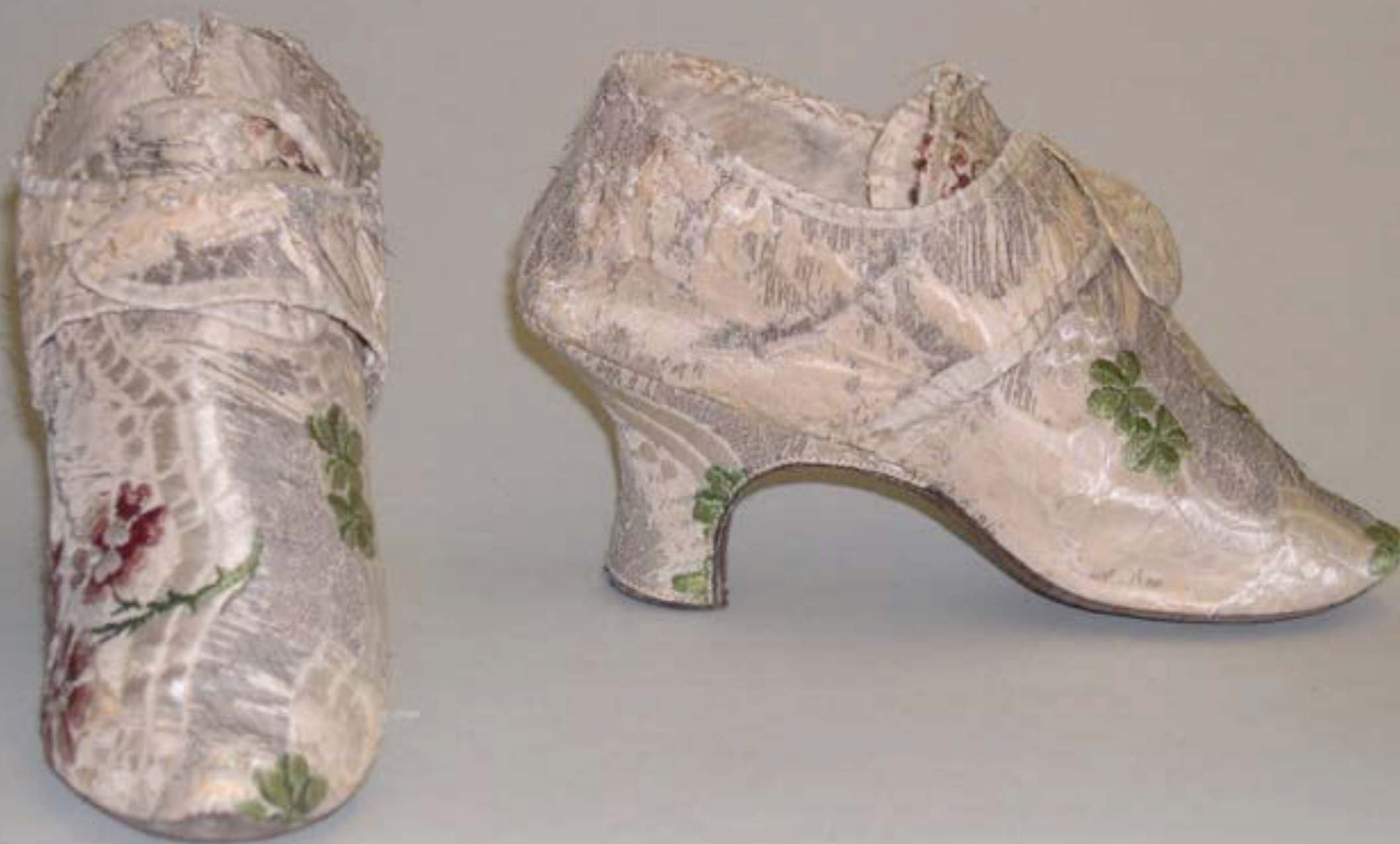
European Silk Buckle Shoes c. 1760 - 1769 (Metropolitan Museum of Art)