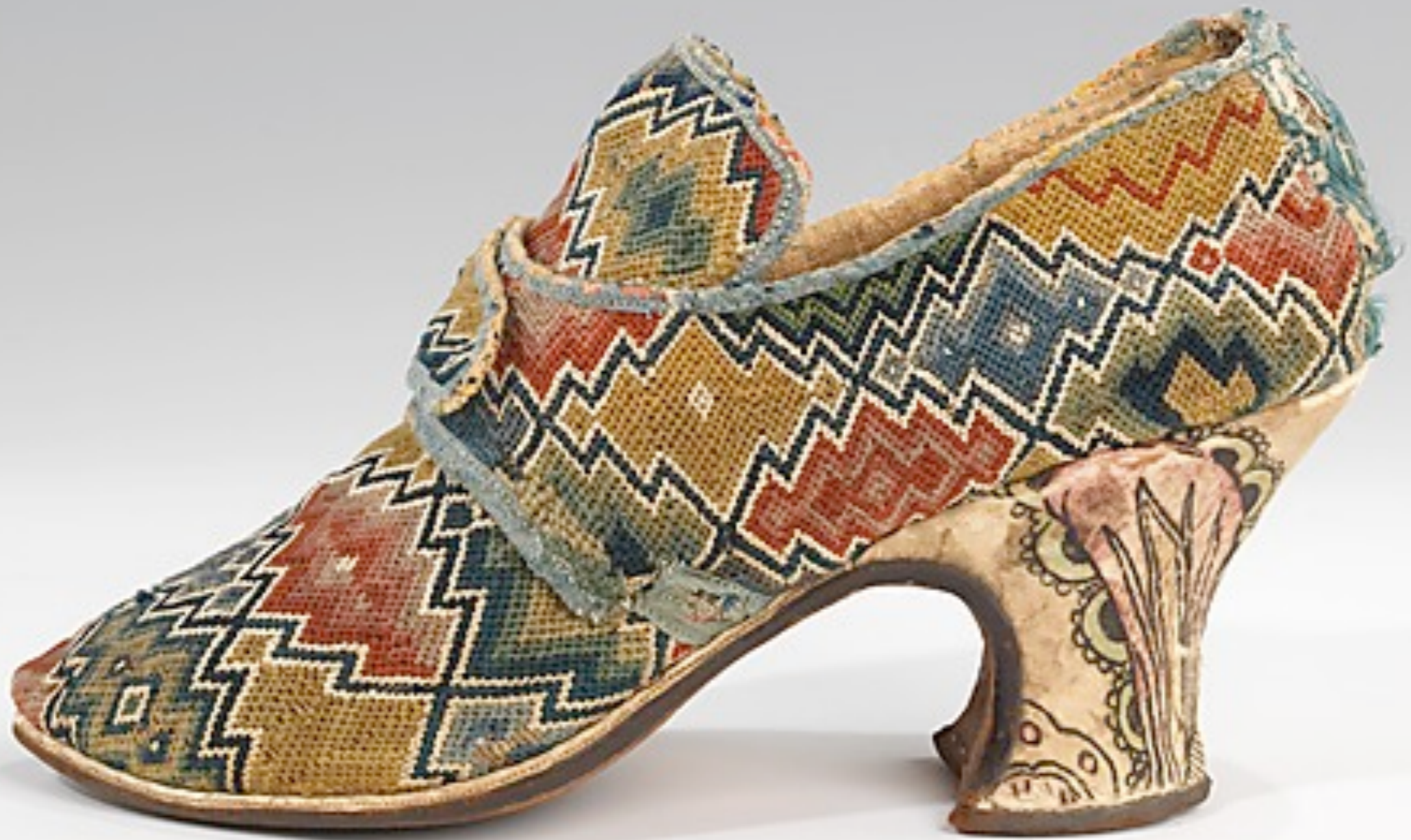
English Irish Stitch Wool Buckle Shoes c. 1750 - 1769 (Metropolitan Museum of Art)