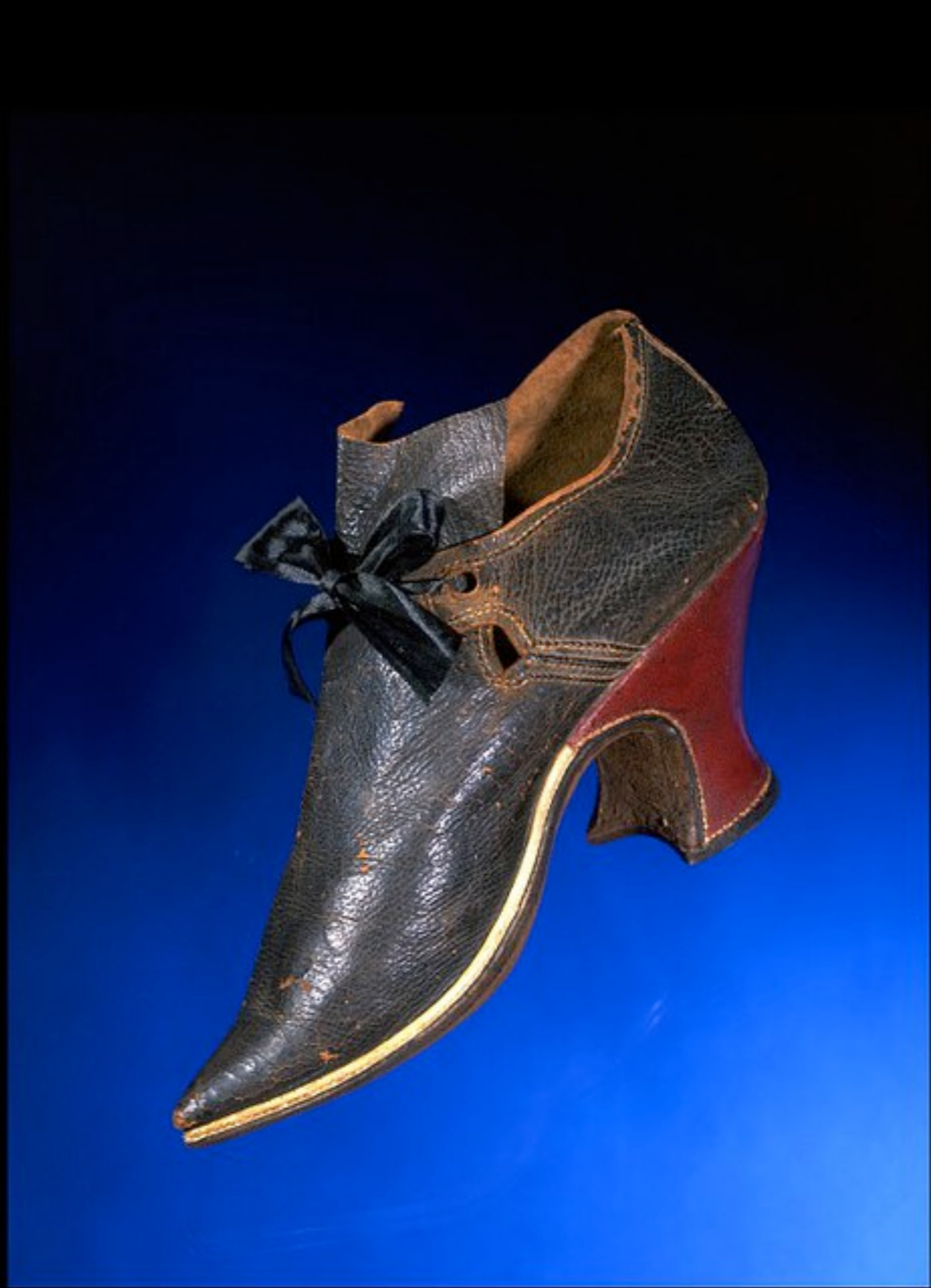
English Leather Tie Shoe with Red Heel