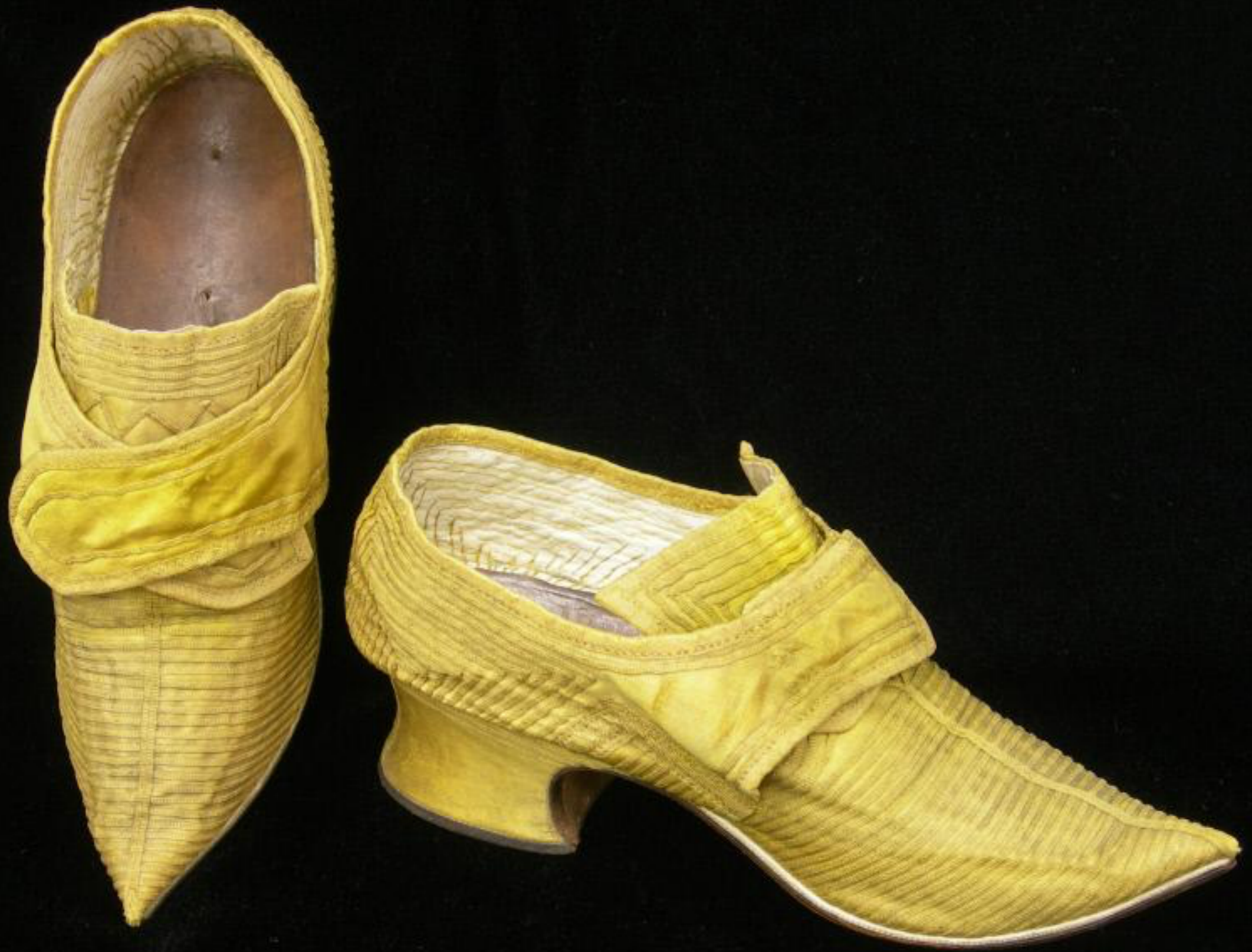
English Silk Satin Buckle Shoes c. 1740 - 1760 (Colonial Williamsburg Foundation)