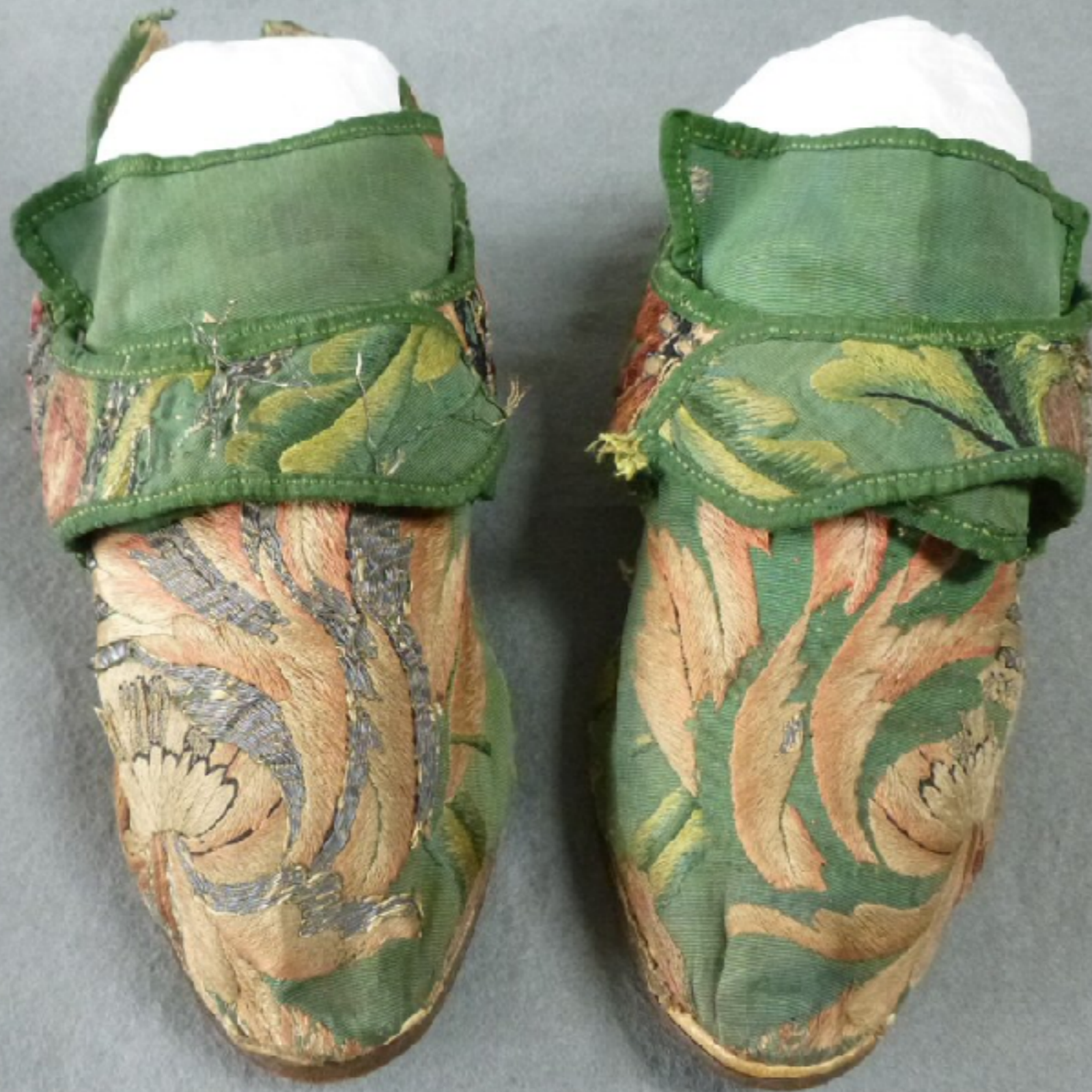
Flat Heeled Silk Buckle Shoes, Likely Made for an Older Woman