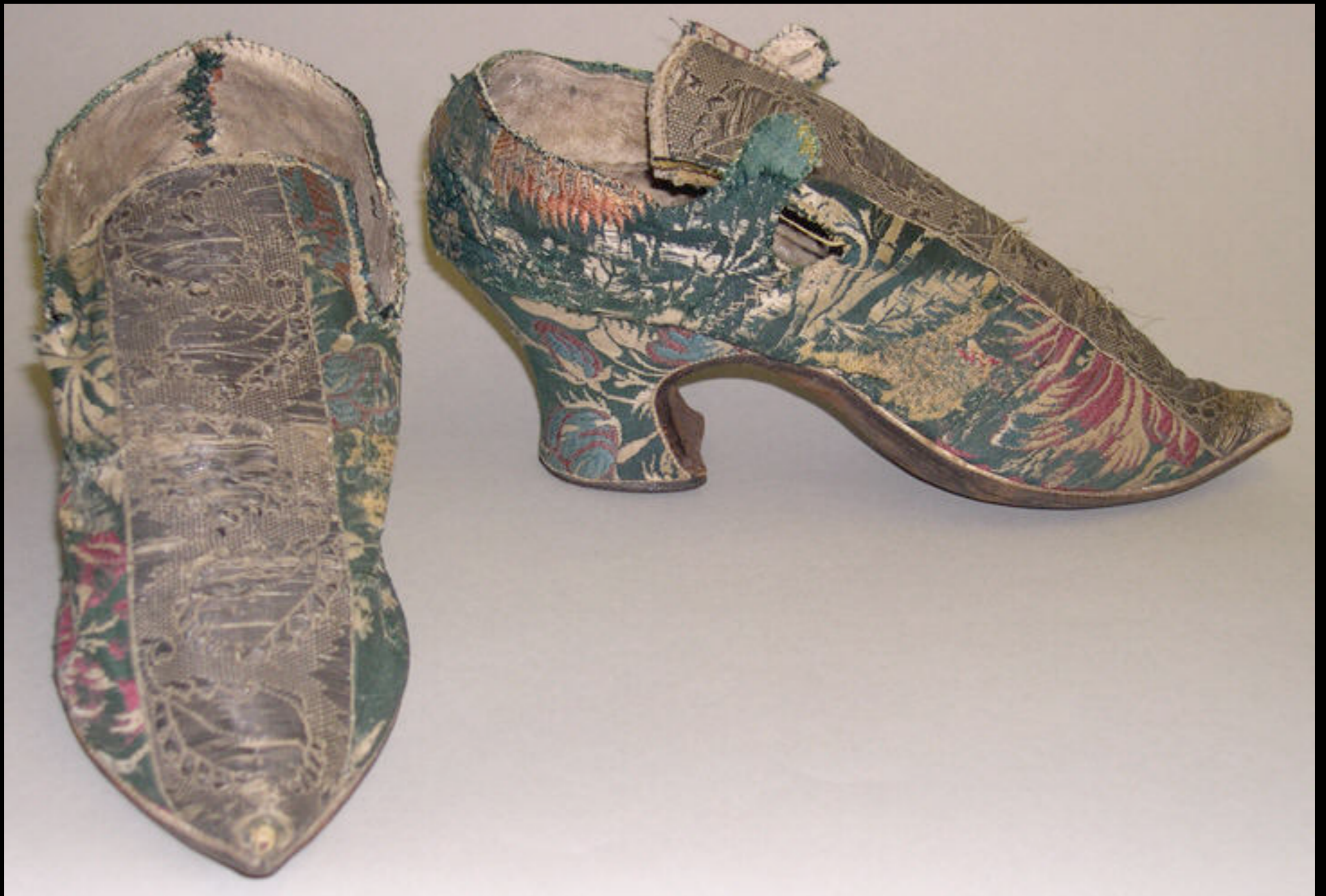
English Silk Buckle Shoes c. 1720 - 1729