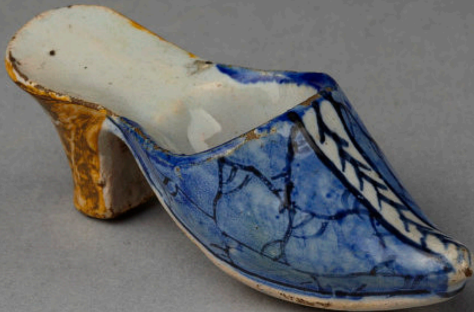
Dutch Tin Glazed Earthenware Slipper or "Mule" 18th Century