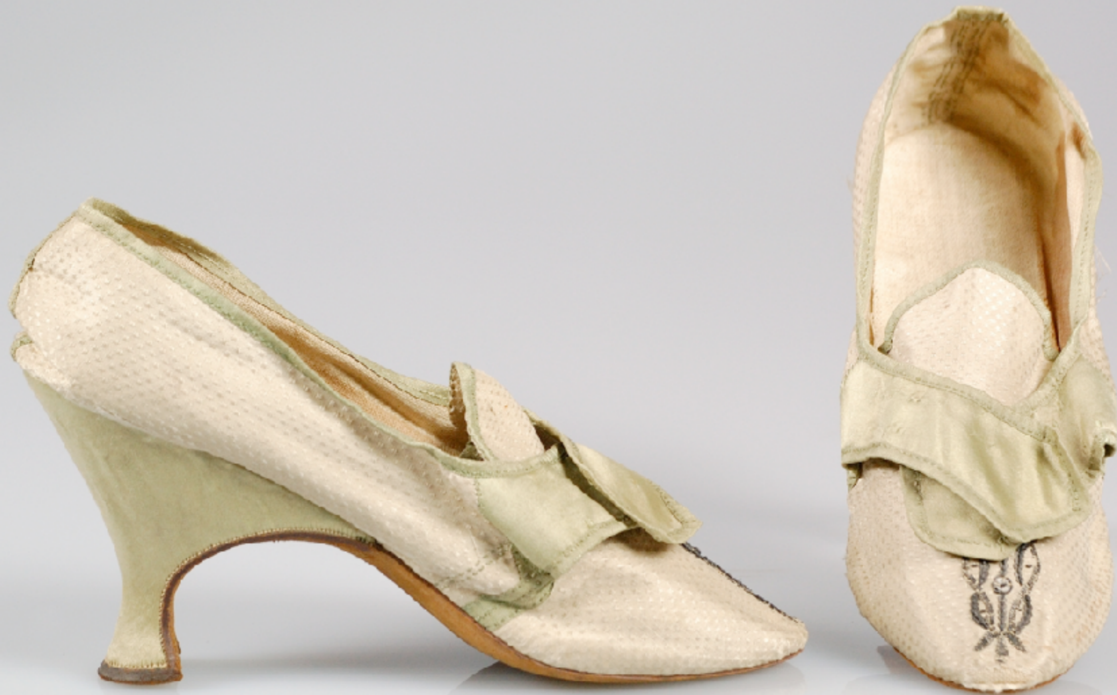
European Silk Buckle Shoes c. 1770 - 1789 (Metropolitan Museum of Art)