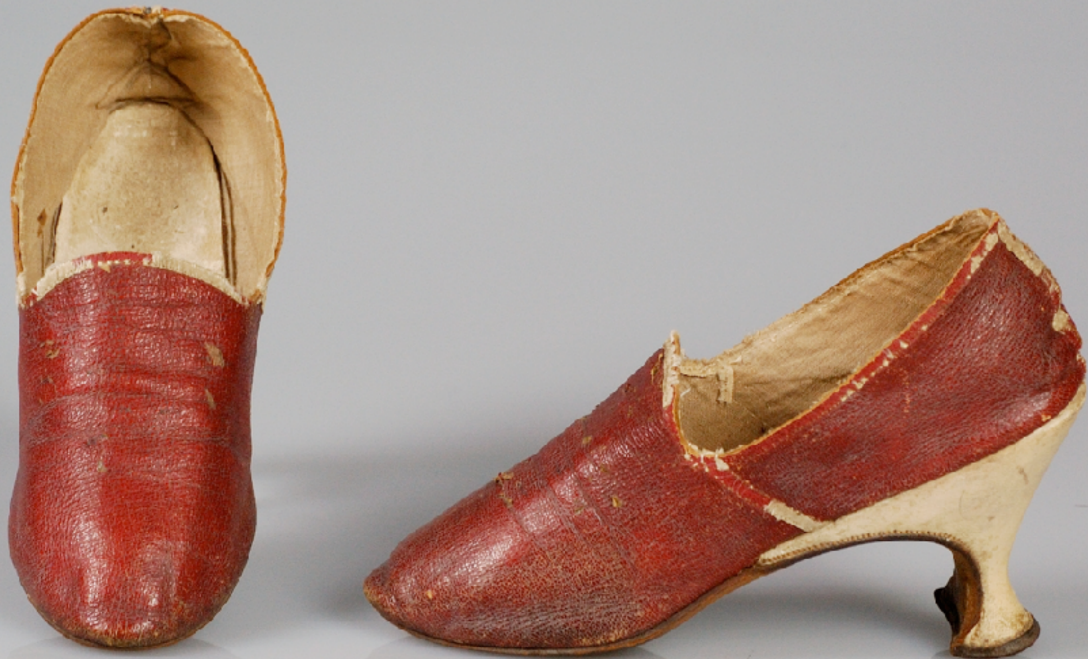
European Leather Slipper Shoes c. 1770 - 1789 (Metropolitan Museum of Art)