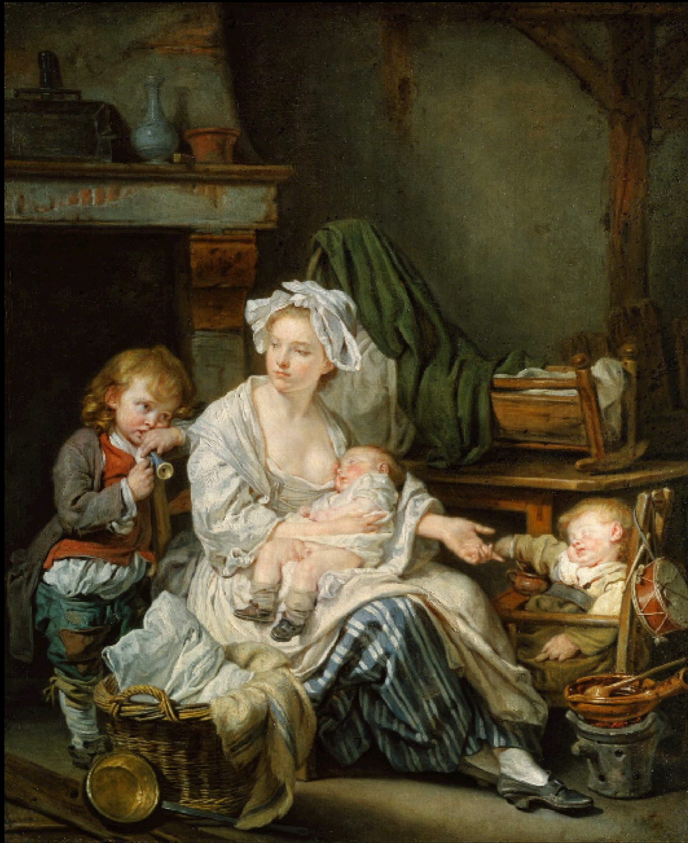
"Silence!" by Jean-Baptiste Greuze 1759 (The Royal Collection)