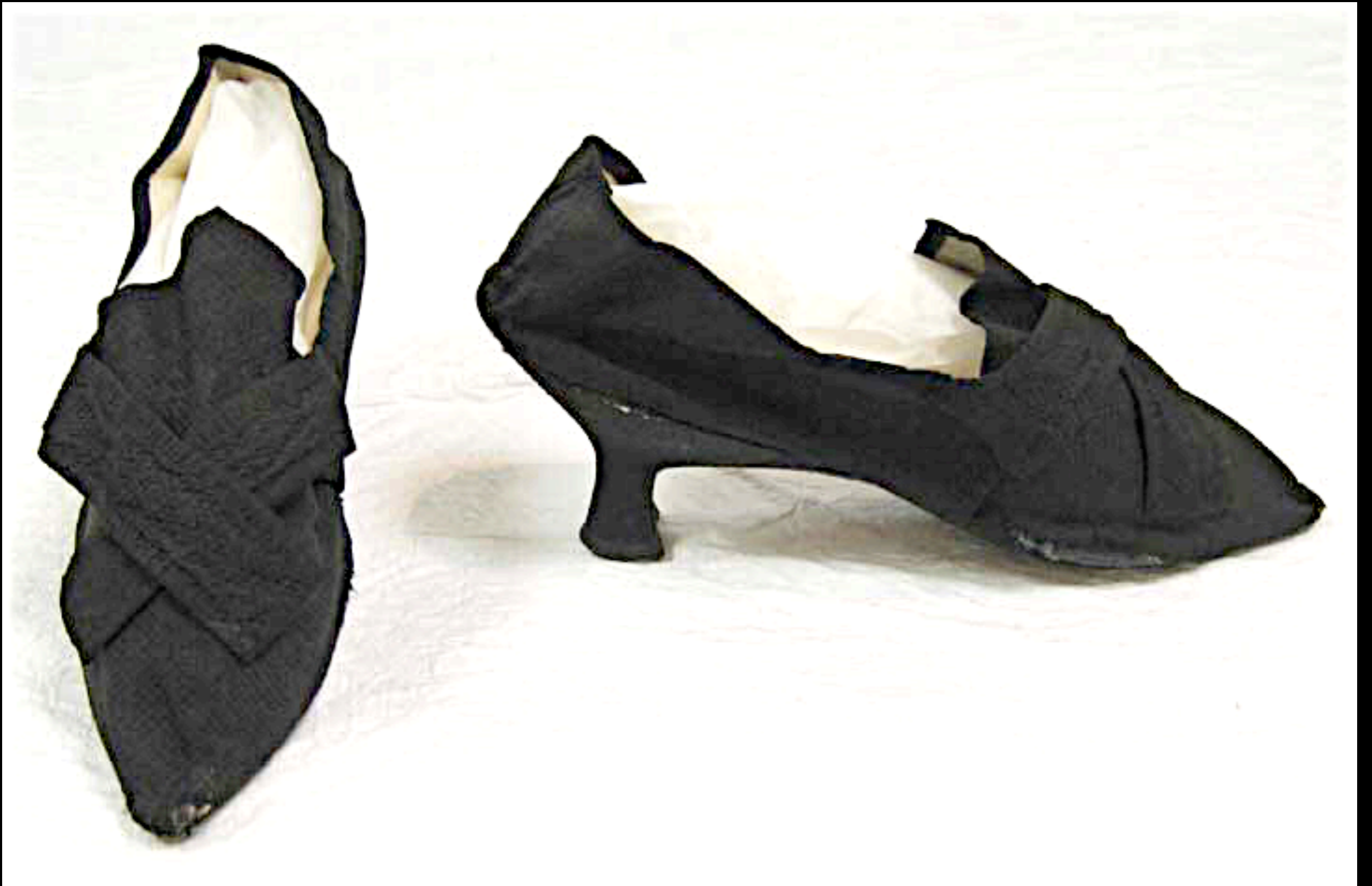
English Silk Buckle Shoe 18th Century (Metropolitan Museum of Art)