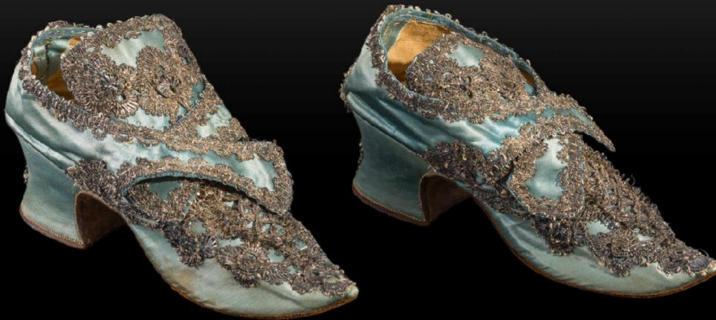
English Silver Lace on Blue Satin Buckle Shoes c. 1750 - 1760 (Colonial Williamsburg Foundation)