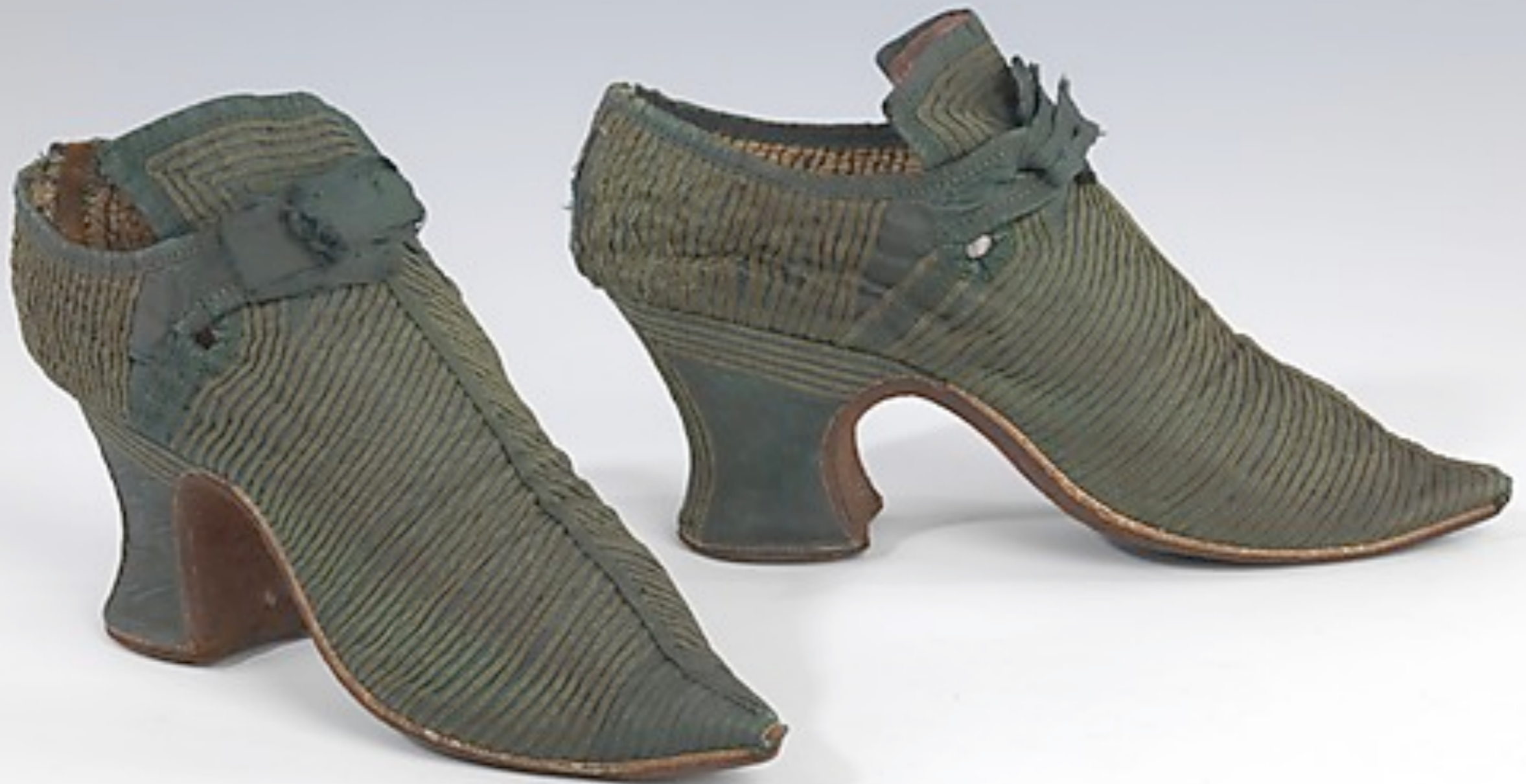
English Silk Tie Shoes c. 1700 - 1739 (Metropolitan Museum of Art)