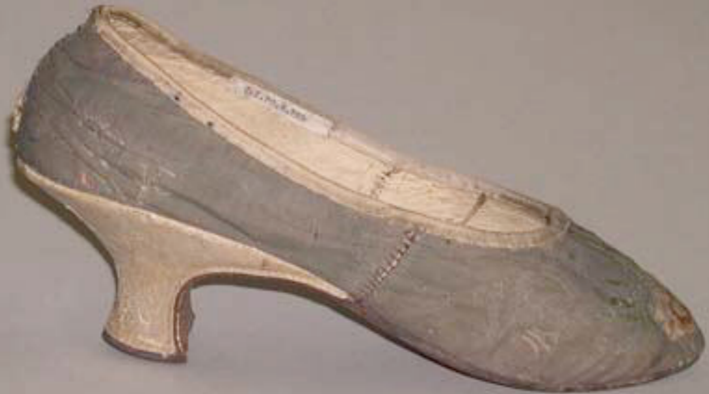
European Silk Slipper Shoes c. 1770 - 1789 (Metropolitan Museum of Art)