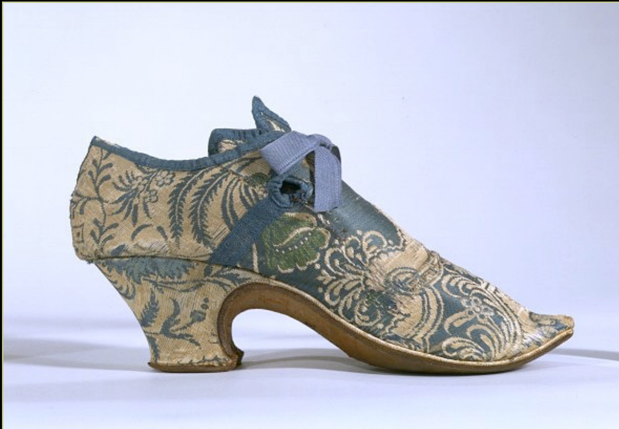
English Silk Tie Shoes