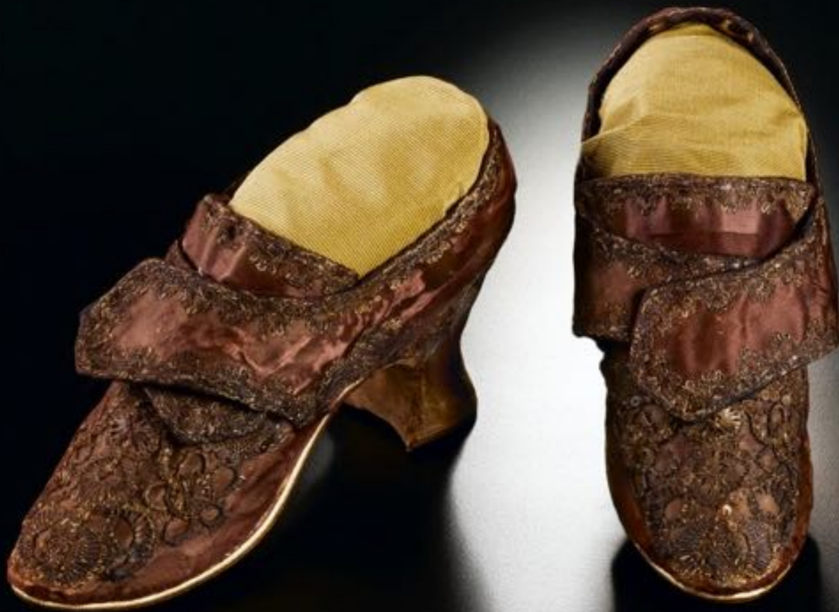
A Pair of Martha Washington's Silk Buckle Shoes (Mount Vernon)