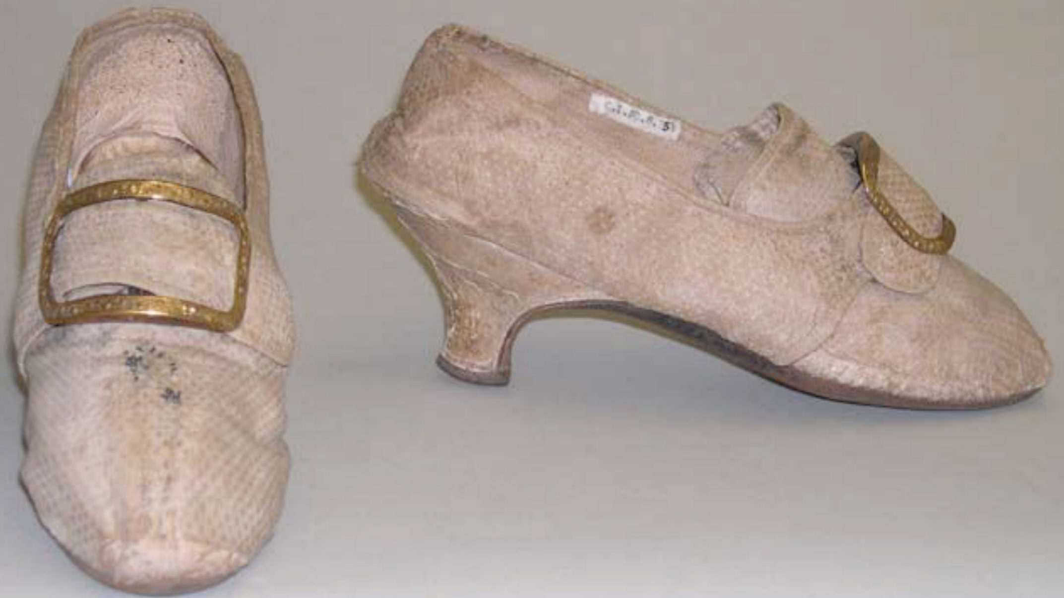
English Silk Shoes with Brass Buckles c. 1775 - 1779 (Metropolitan Museum of Art)