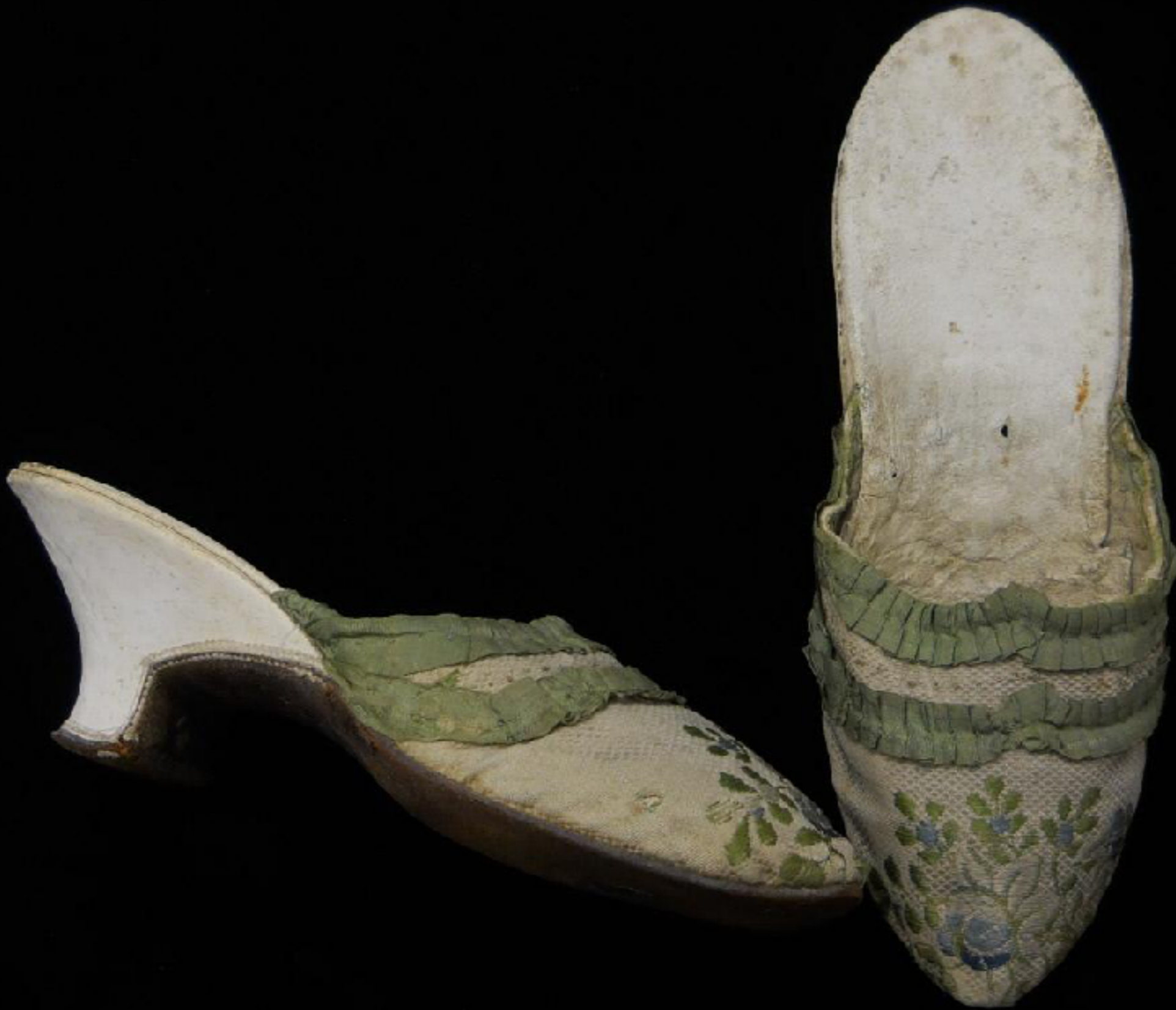
European Brocaded Silk Mules or Backless Slippers c. 170 - 1780 (Colonial Williamsburg Foundation)