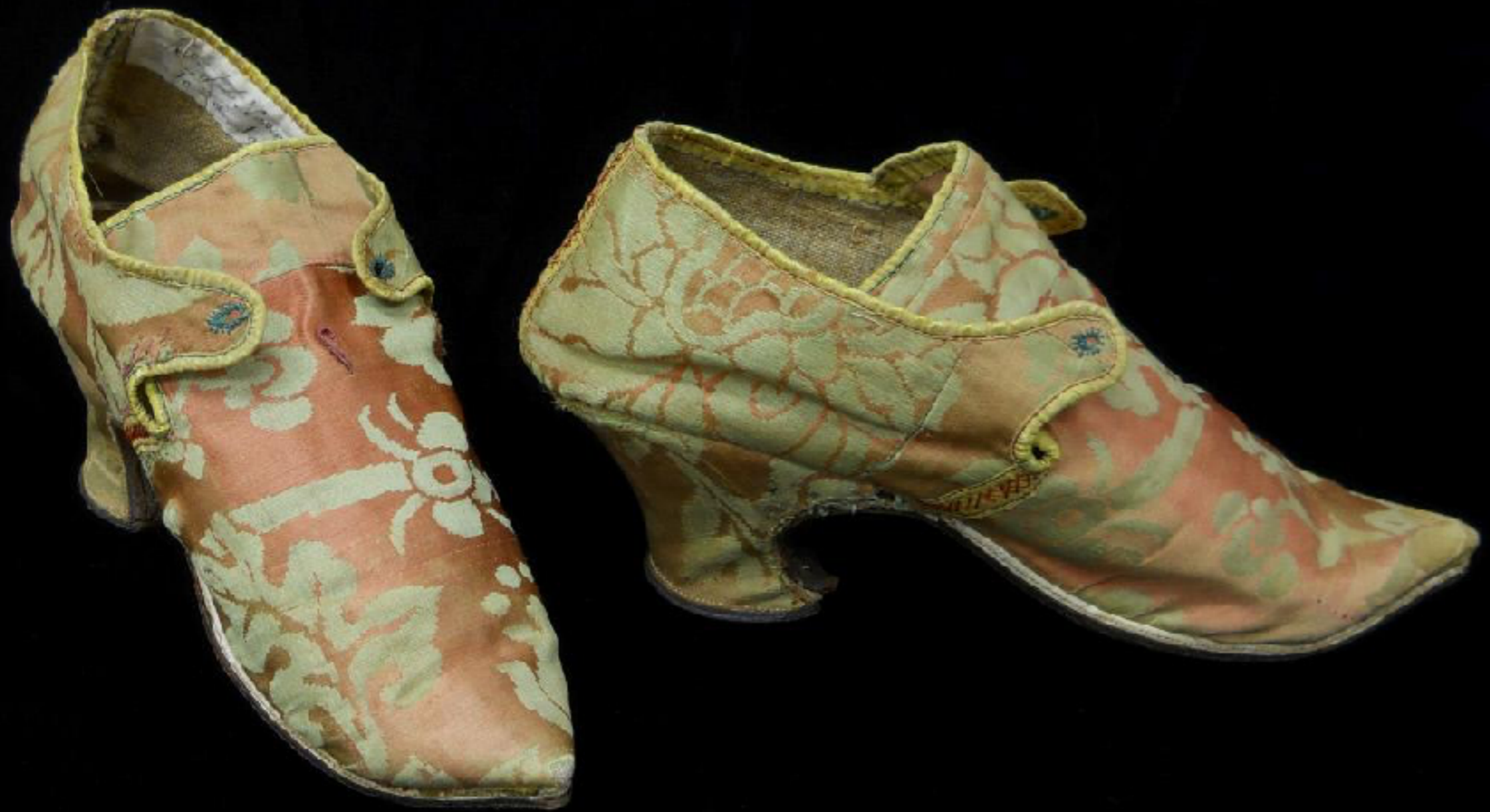
English or American Imported Chinese Silk Tie Shoes Worn in New York c. 1740 - 1760