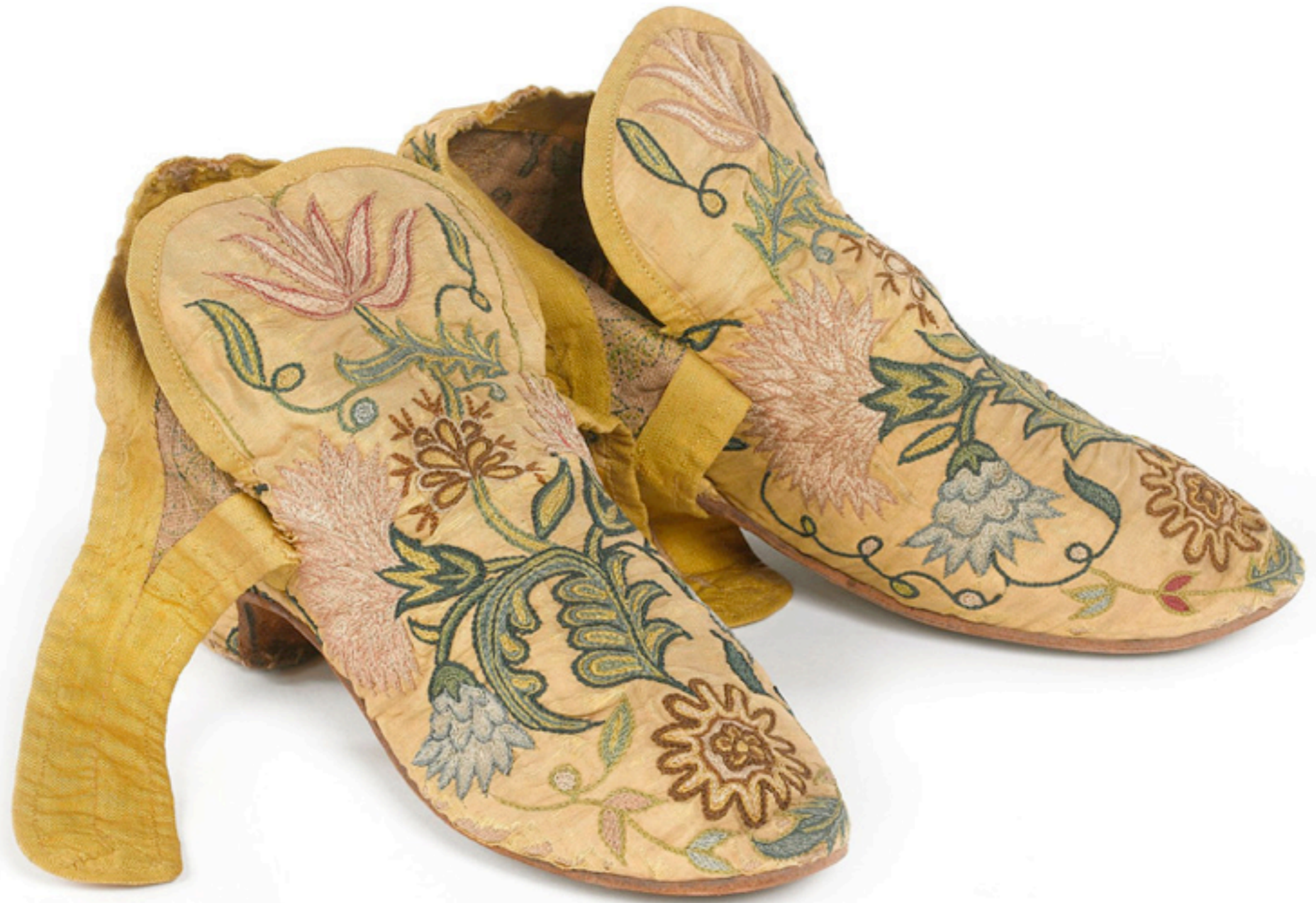
English Silk Buckle Shoes