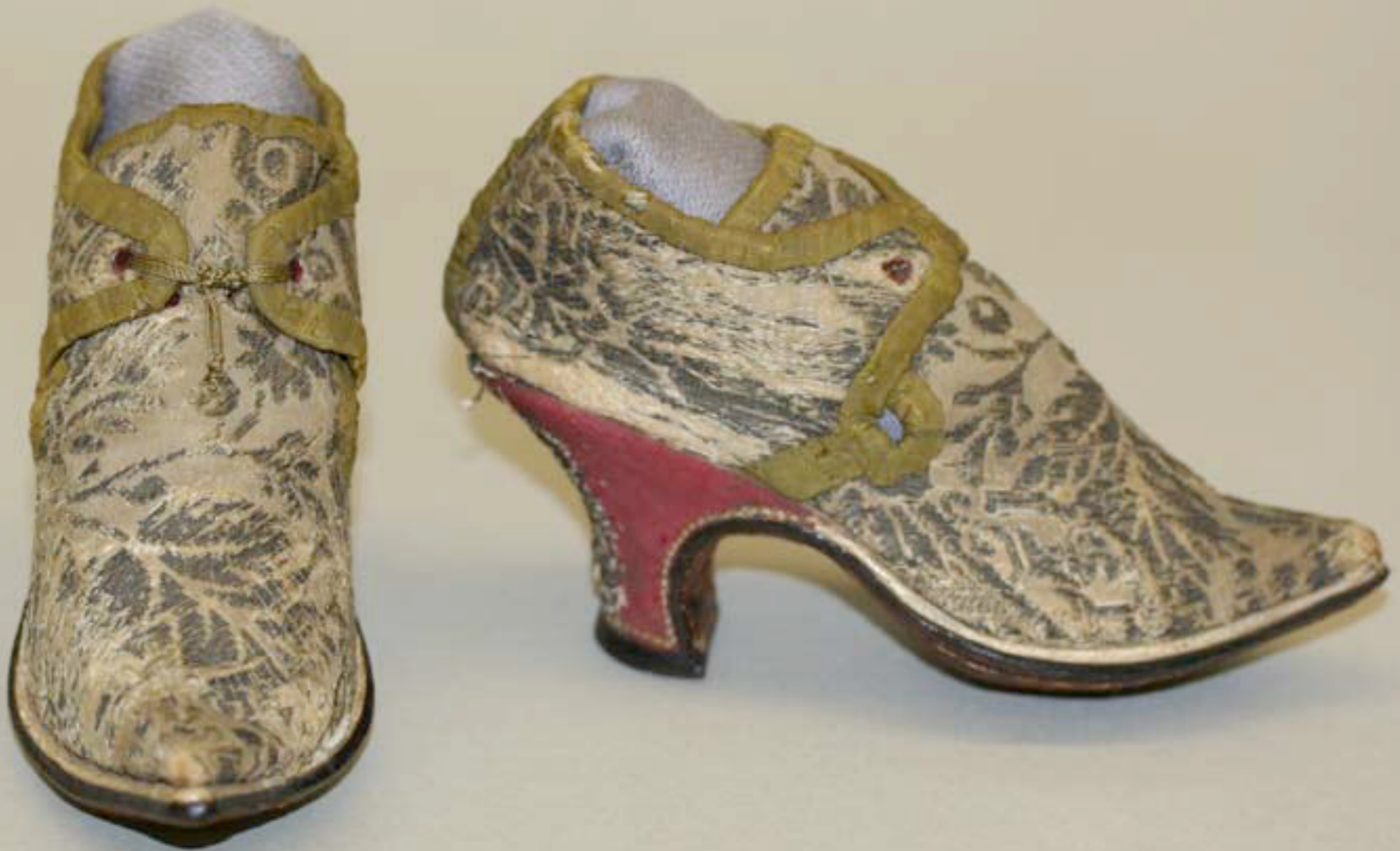
French Silk Buckle Shoes 18th Century (Metropolitan Museum of Art)