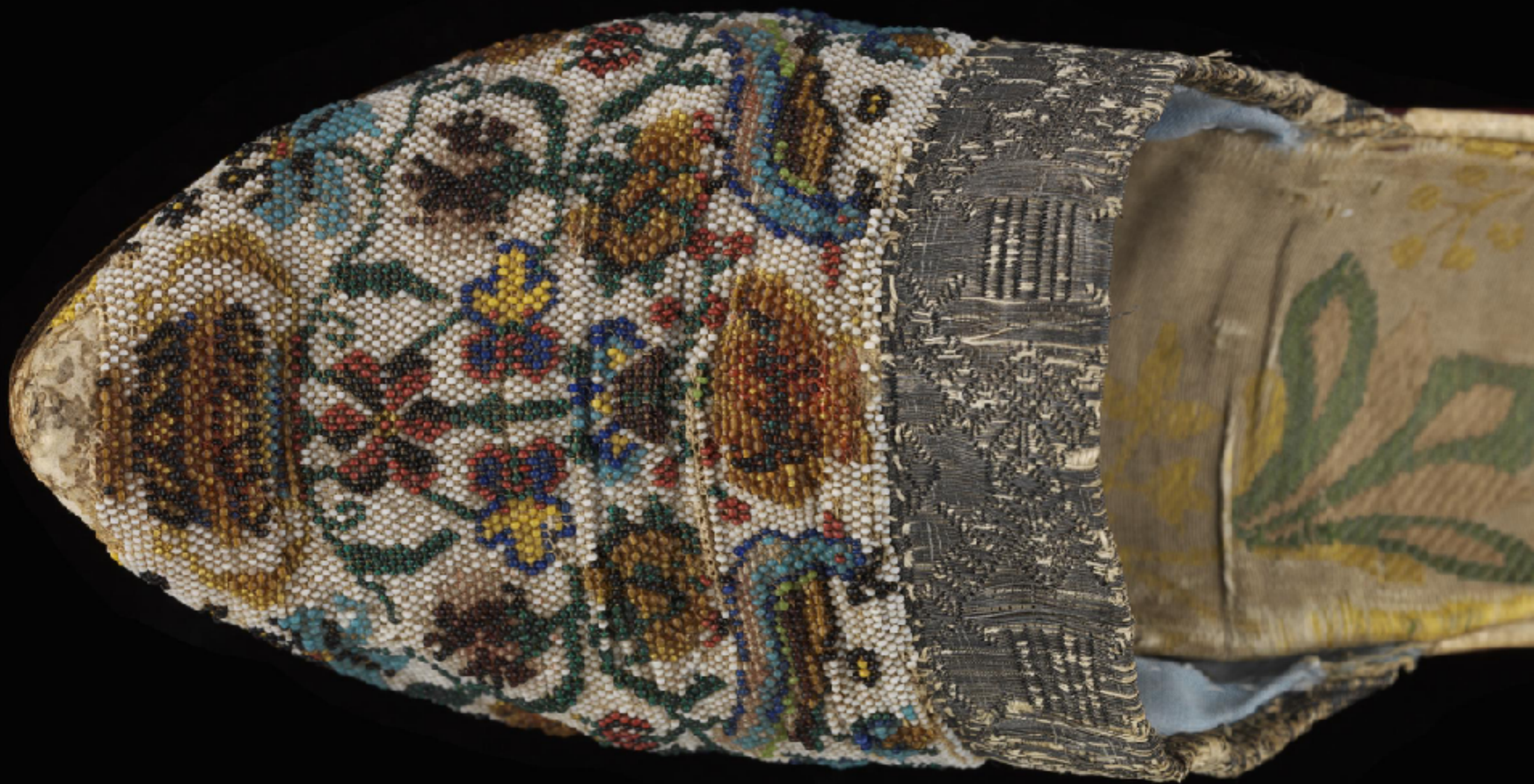
French Beaded Canvas & Leather Mule Owned by Queen Caroline, Wife of George II of England