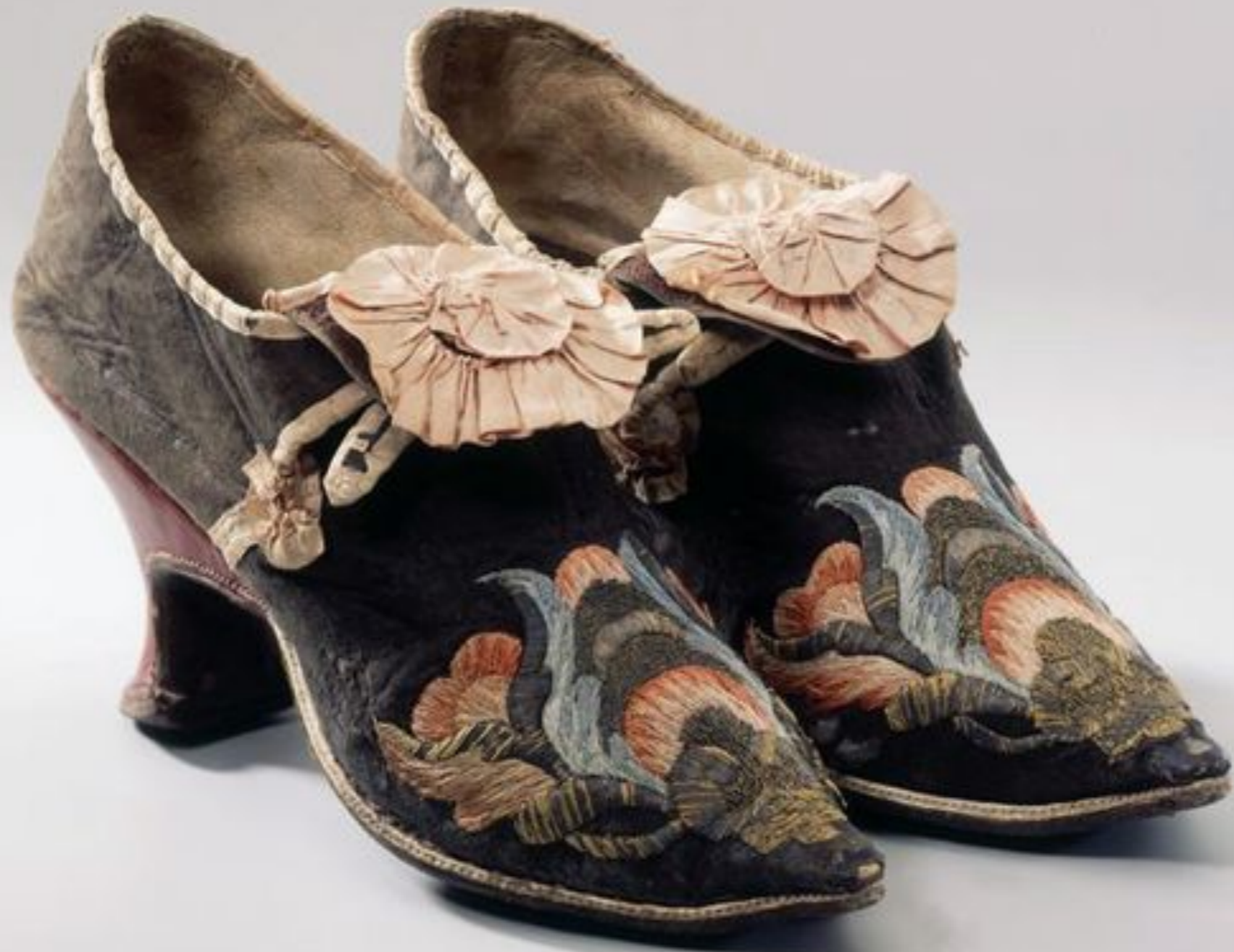
French Silk Buckle Shoes c. 1700 - 1750 (Schweizerisches National Museum.)