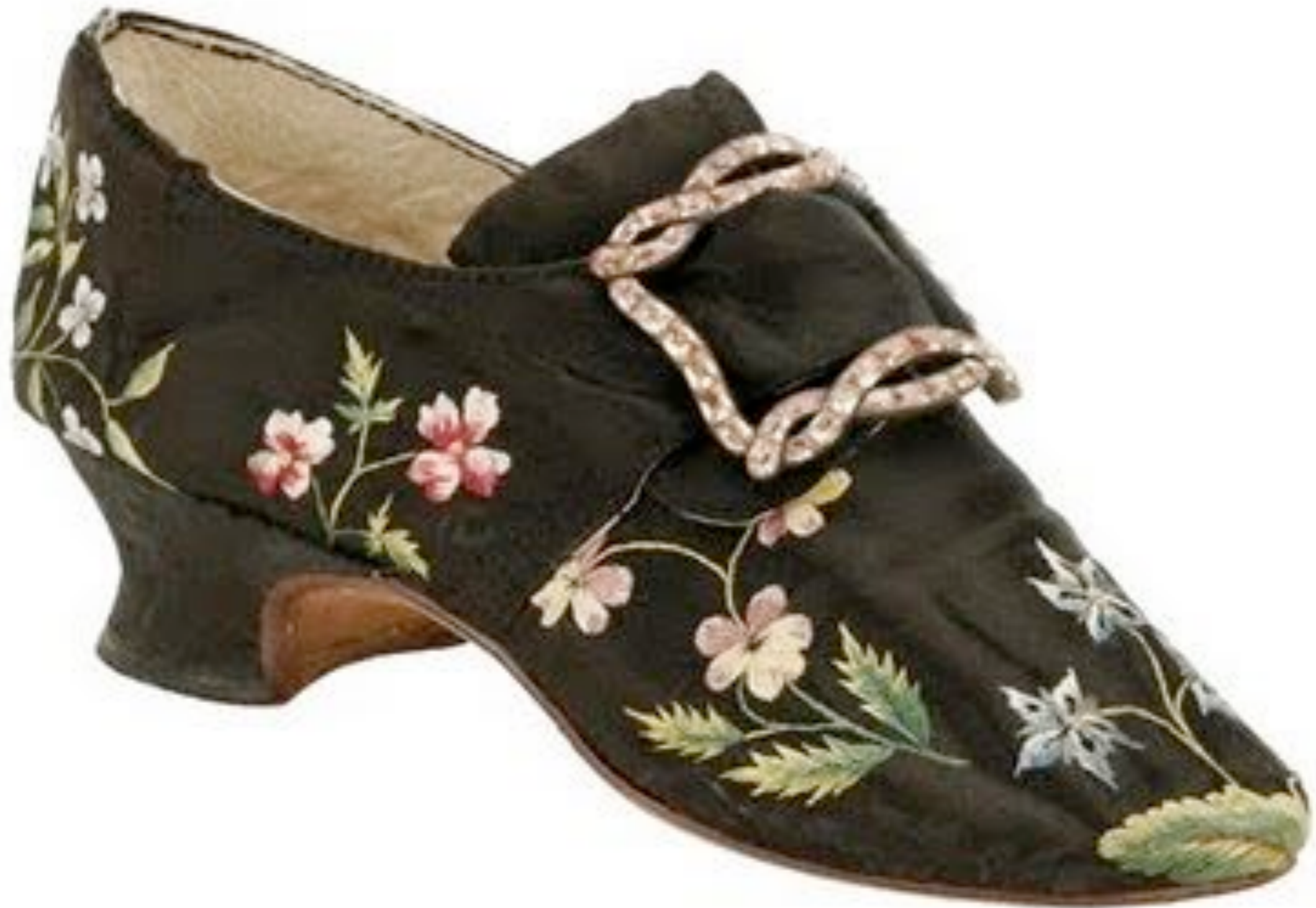
Silk Buckle Shoe Mid 18th Century (Private Collection)