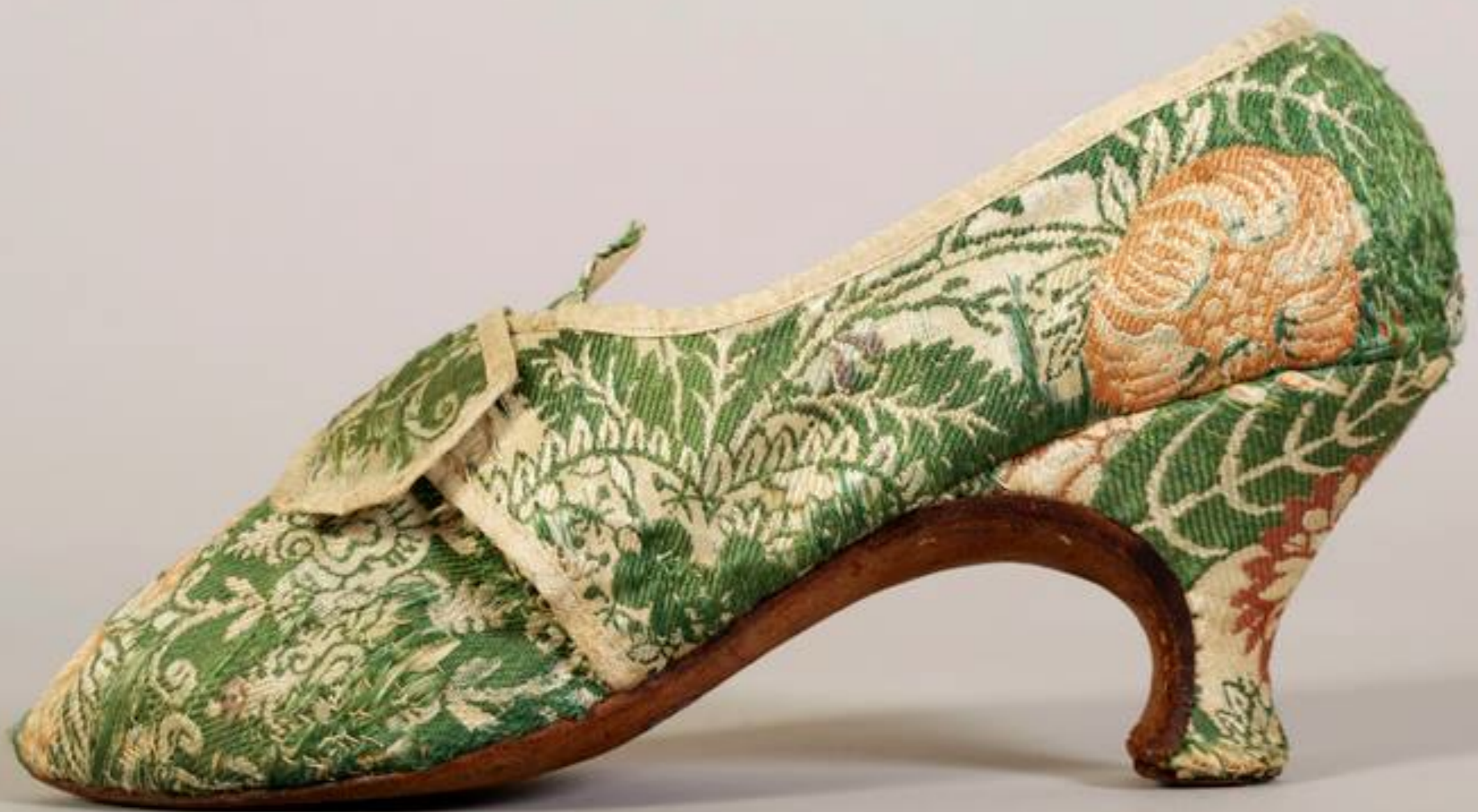
Brocade Shoes c. 1780 (Kent State University Museum)