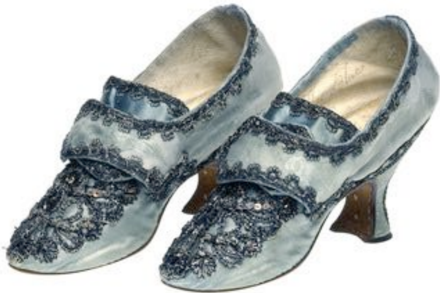
English Silk Buckle Shoes 'Miss Ellis Blue / Satten'