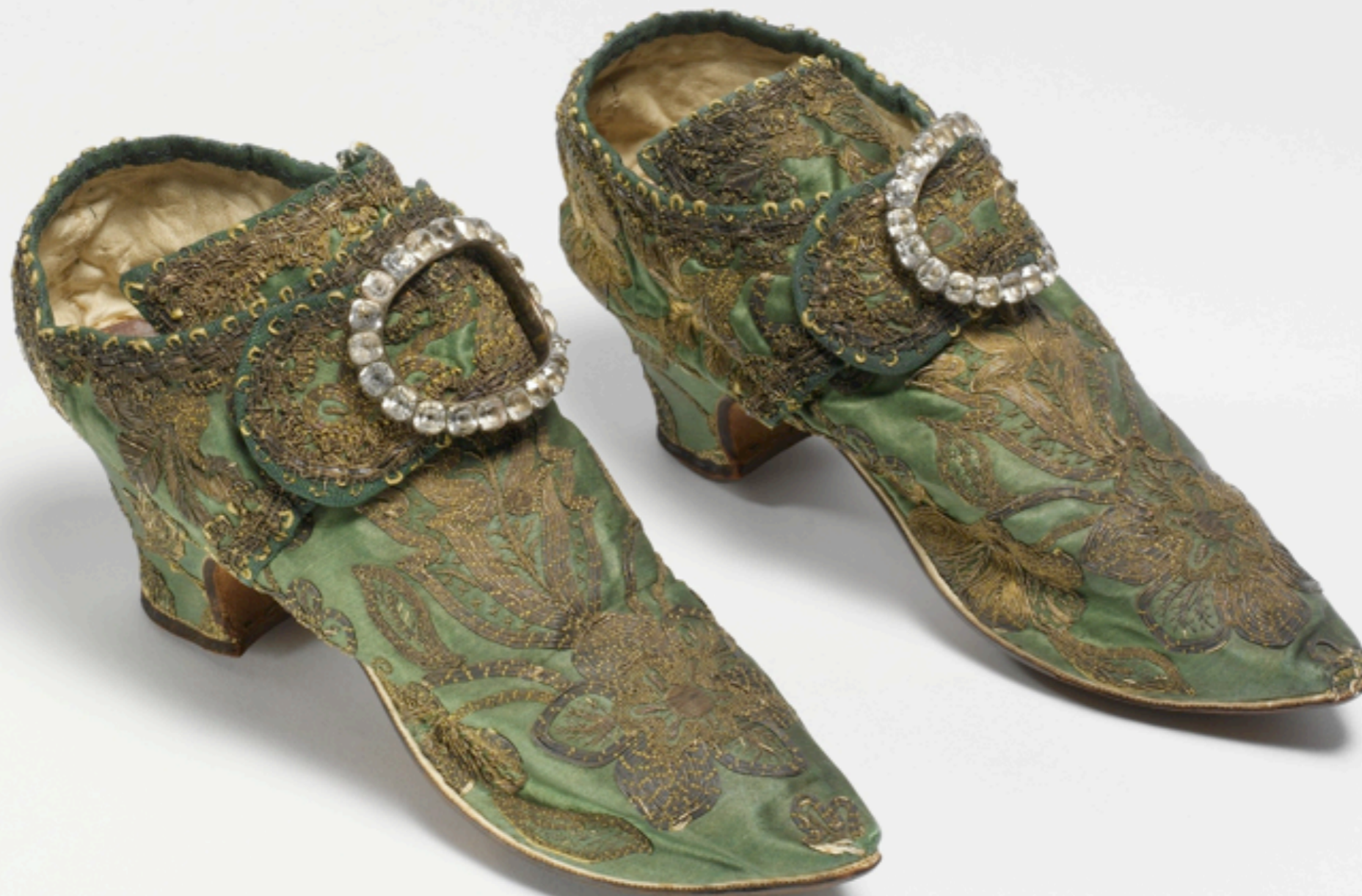
English Silk Buckle Shoes with Paste Buckles