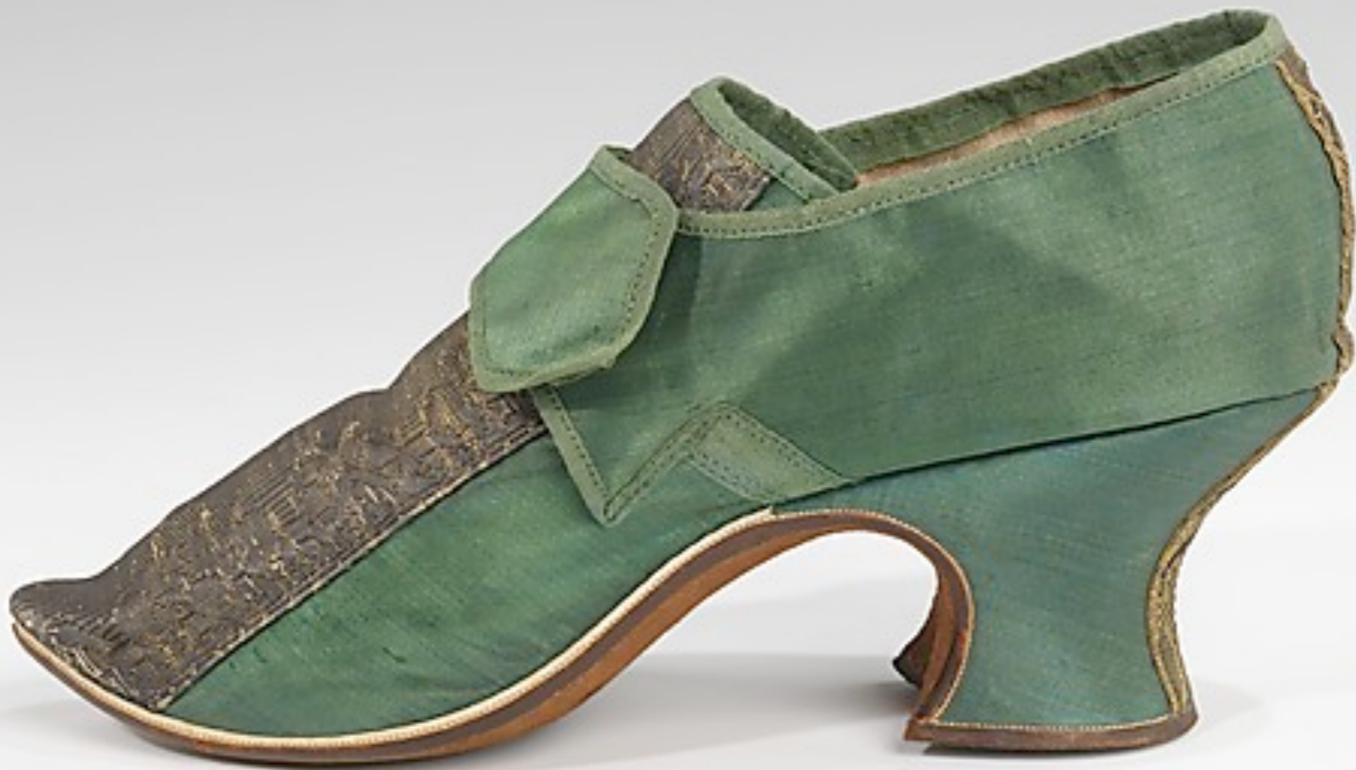
English Metallic Lace & Silk Buckle Shoes