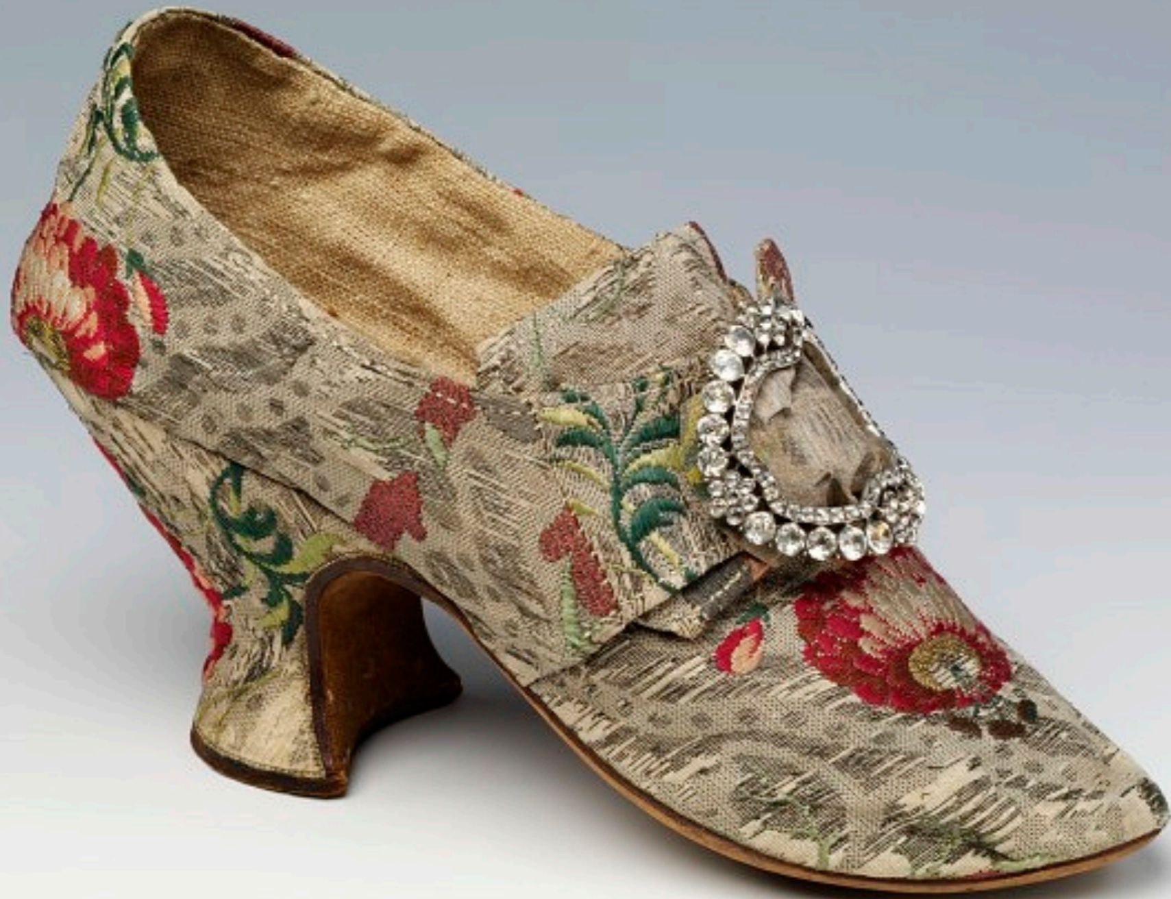
English Silk Shoe with Paste Buckle c. 1760 - 1770 (Victoria & Albert Museum)