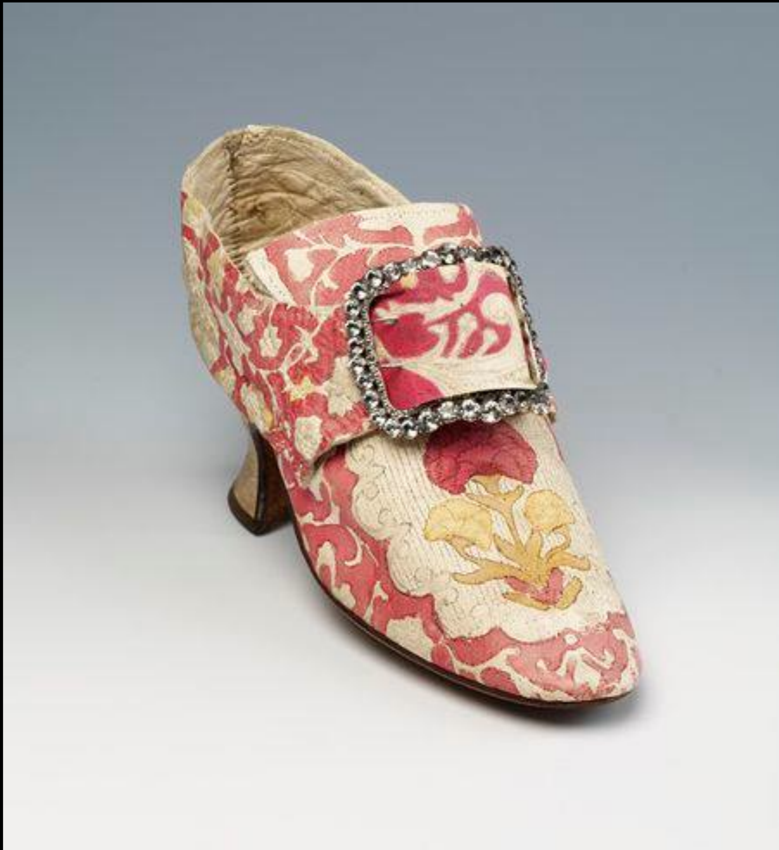
Painted Kid Leather Shoes, Possibly from Brussels c. 1760 (Victoria & Albert)