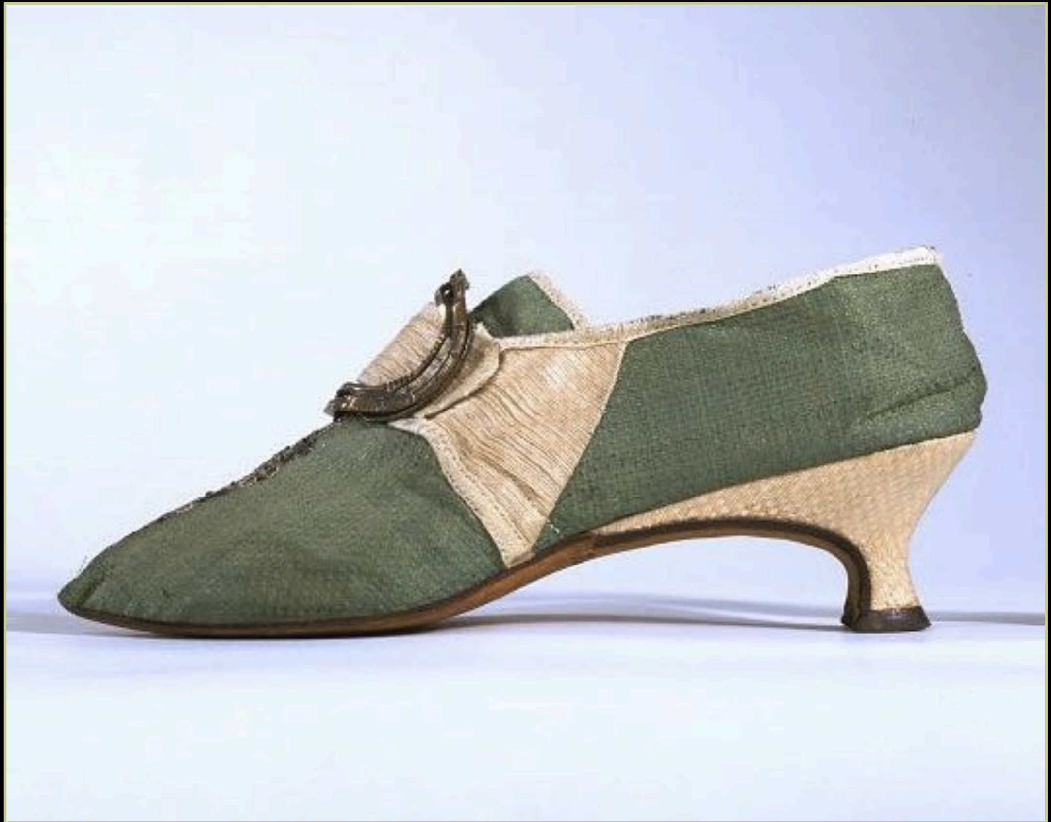
English Buckle Shoe c. 1770 - 1780 (Victoria & Albert Museum)