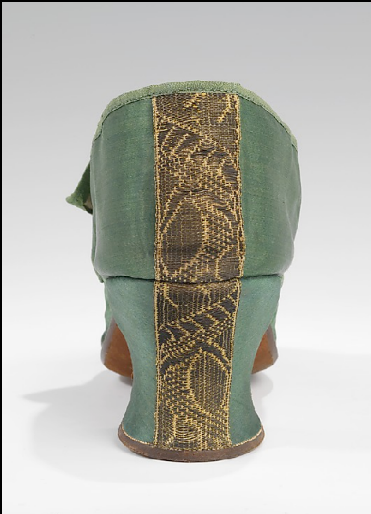
English Metallic Lace & Silk Buckle Shoes