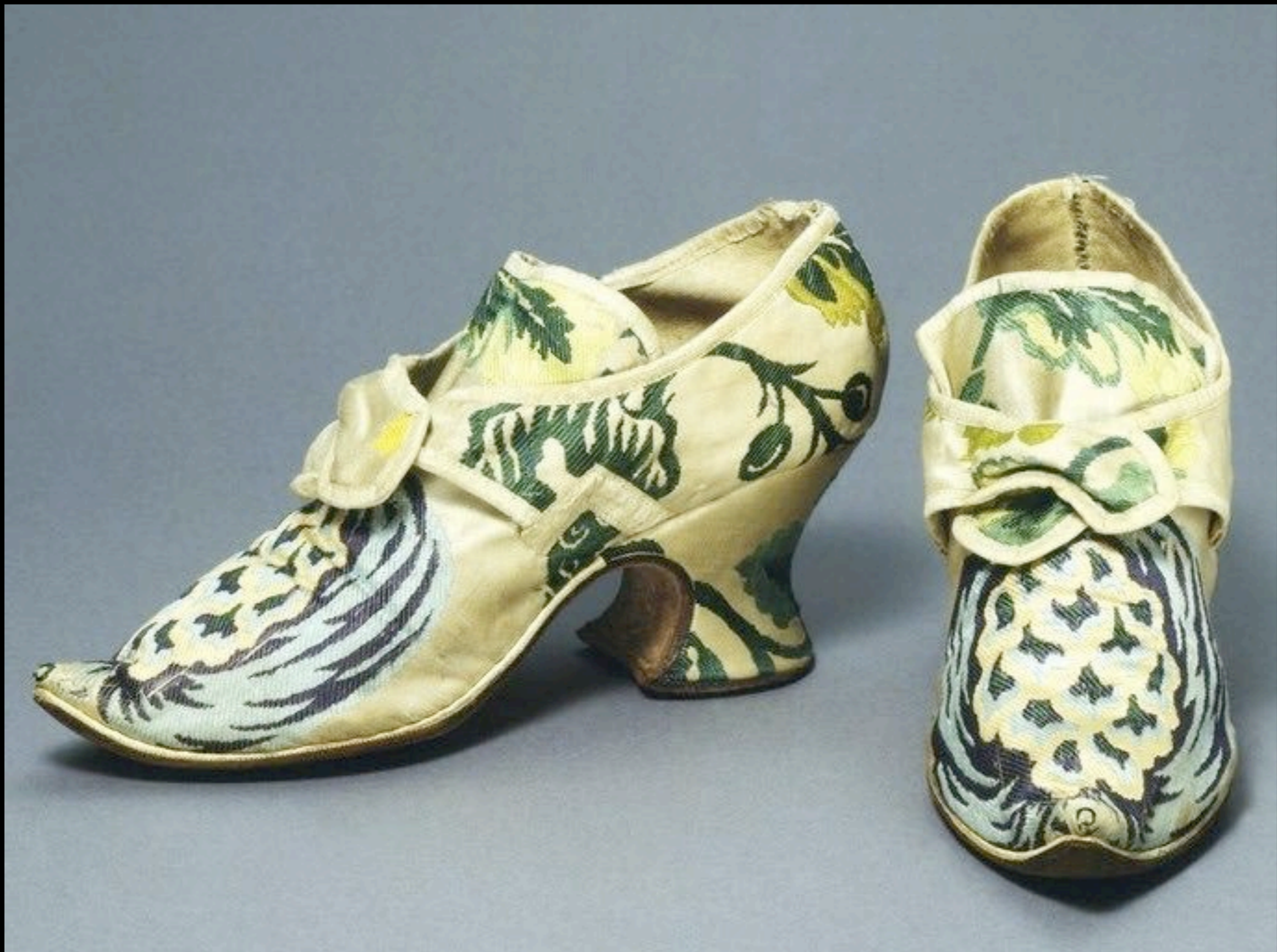
English Brocaded Silk Buckle Shoes from Spitafields