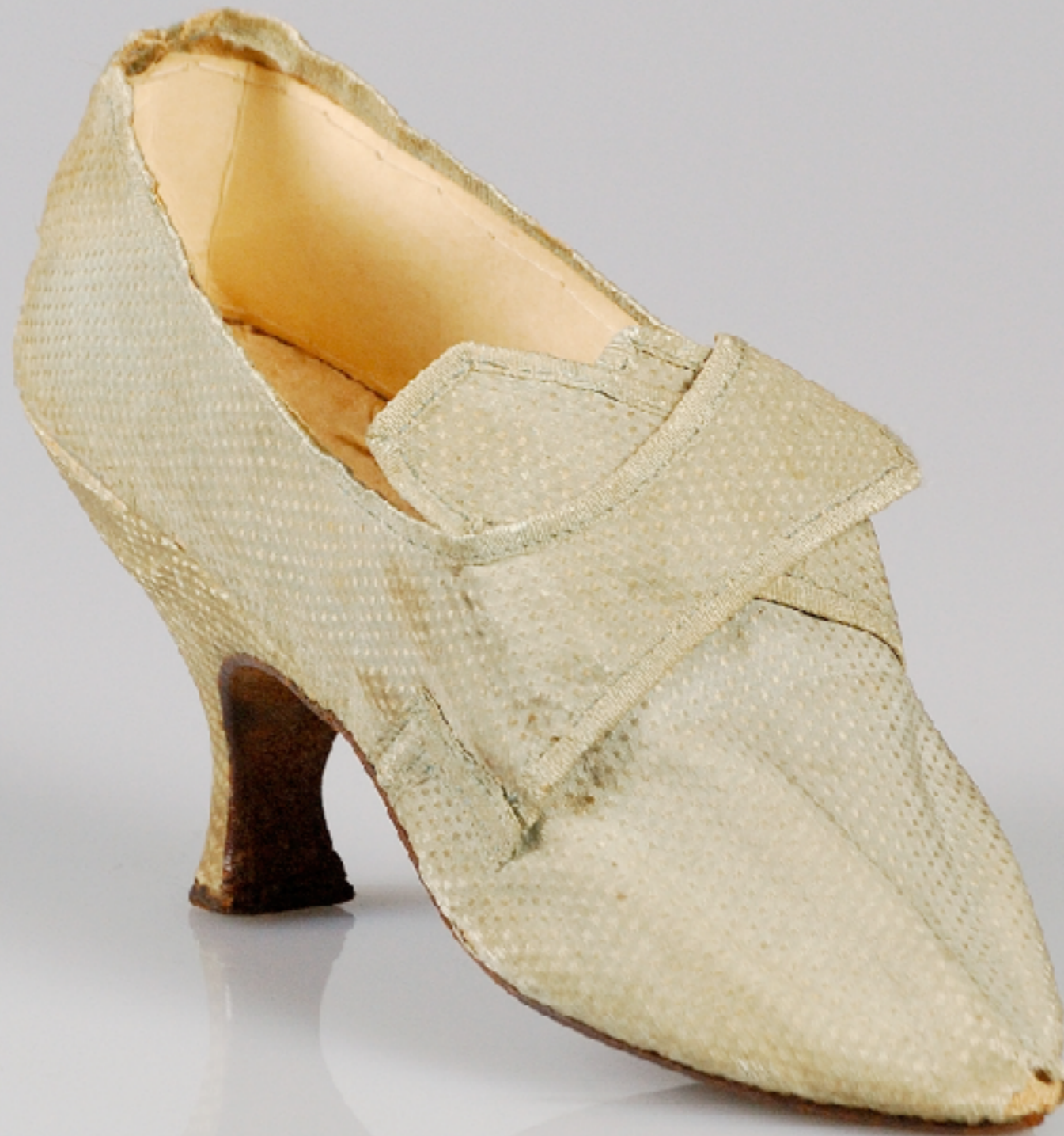
American Silk Buckle Shoes c. 1780 -1785 (Metropolitan Museum of Art)