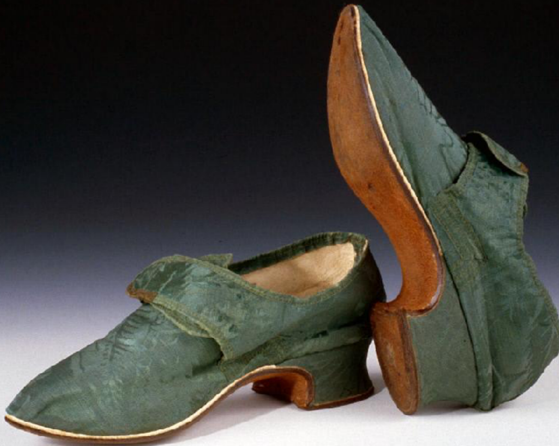
English Silk Damask Buckle Shoes c. 1760 - 1770 (Colonial Williamsburg Foundation)