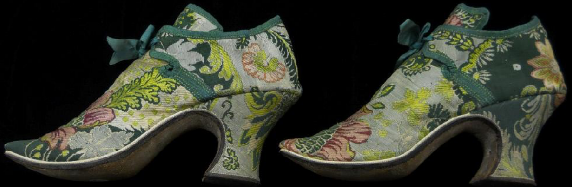
English Brocaded Silk Tie Shoes c. 1720 - 1730 (Colonial Williamsburg Foundation)