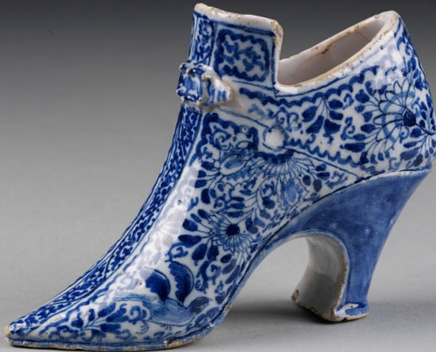
Dutch Tin Glazed Earthenware Shoe