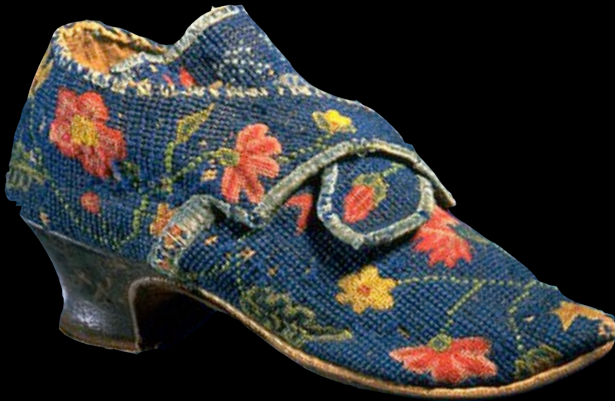
English Linen Canvas with Wool Embroidery Buckle Shoe