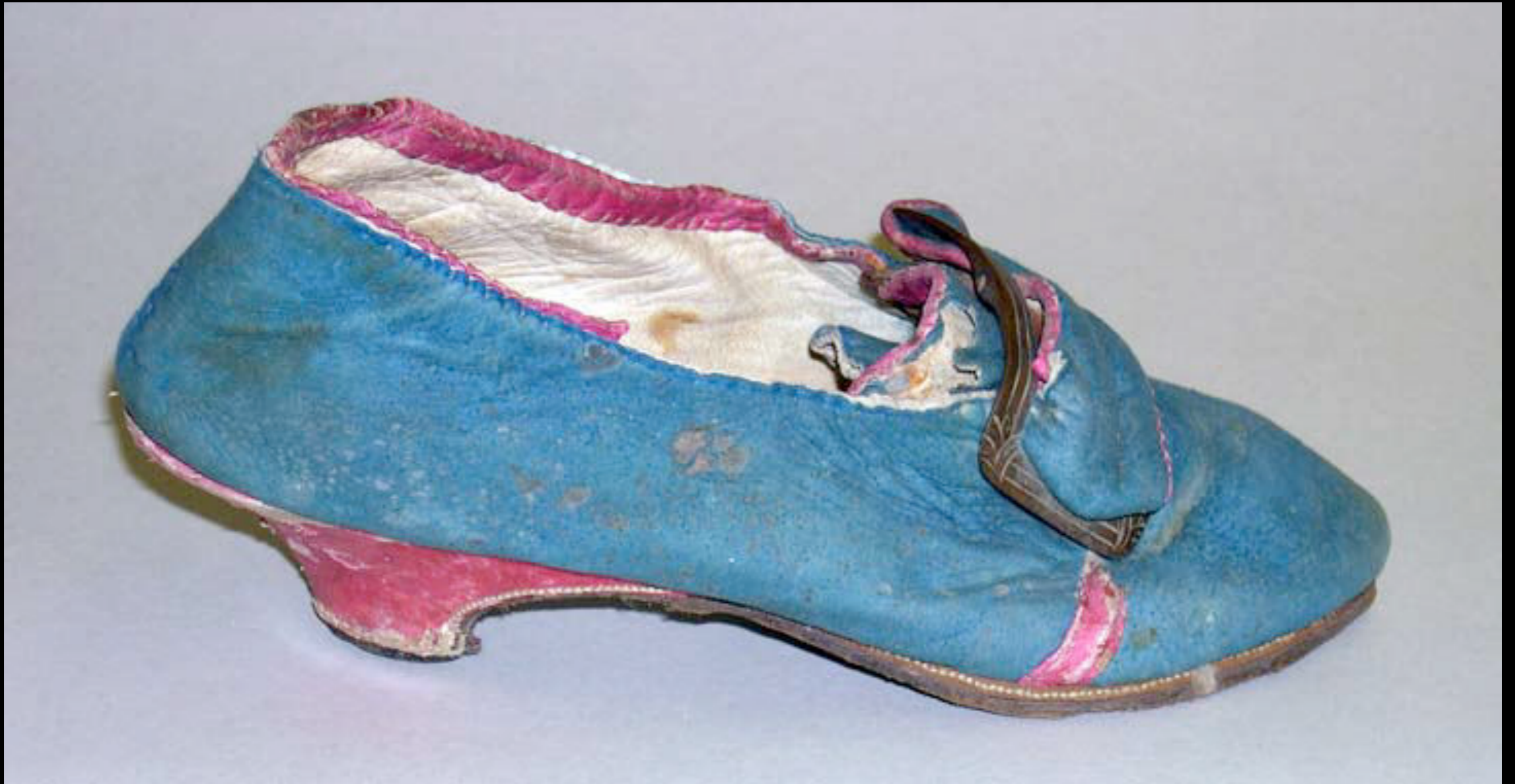
Italian Silk Buckle Shoe Late 18th Century (Metropolitan Museum of Art)