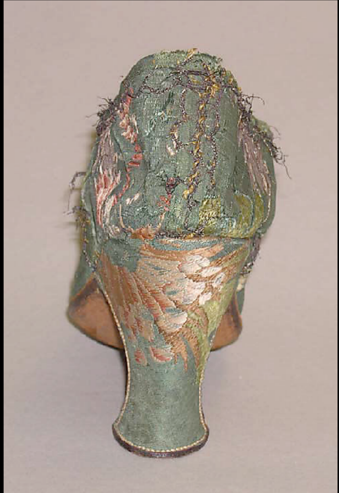
French Silk Buckle Shoes c. 1730 - 1739 (Metropolitan Museum of Art)