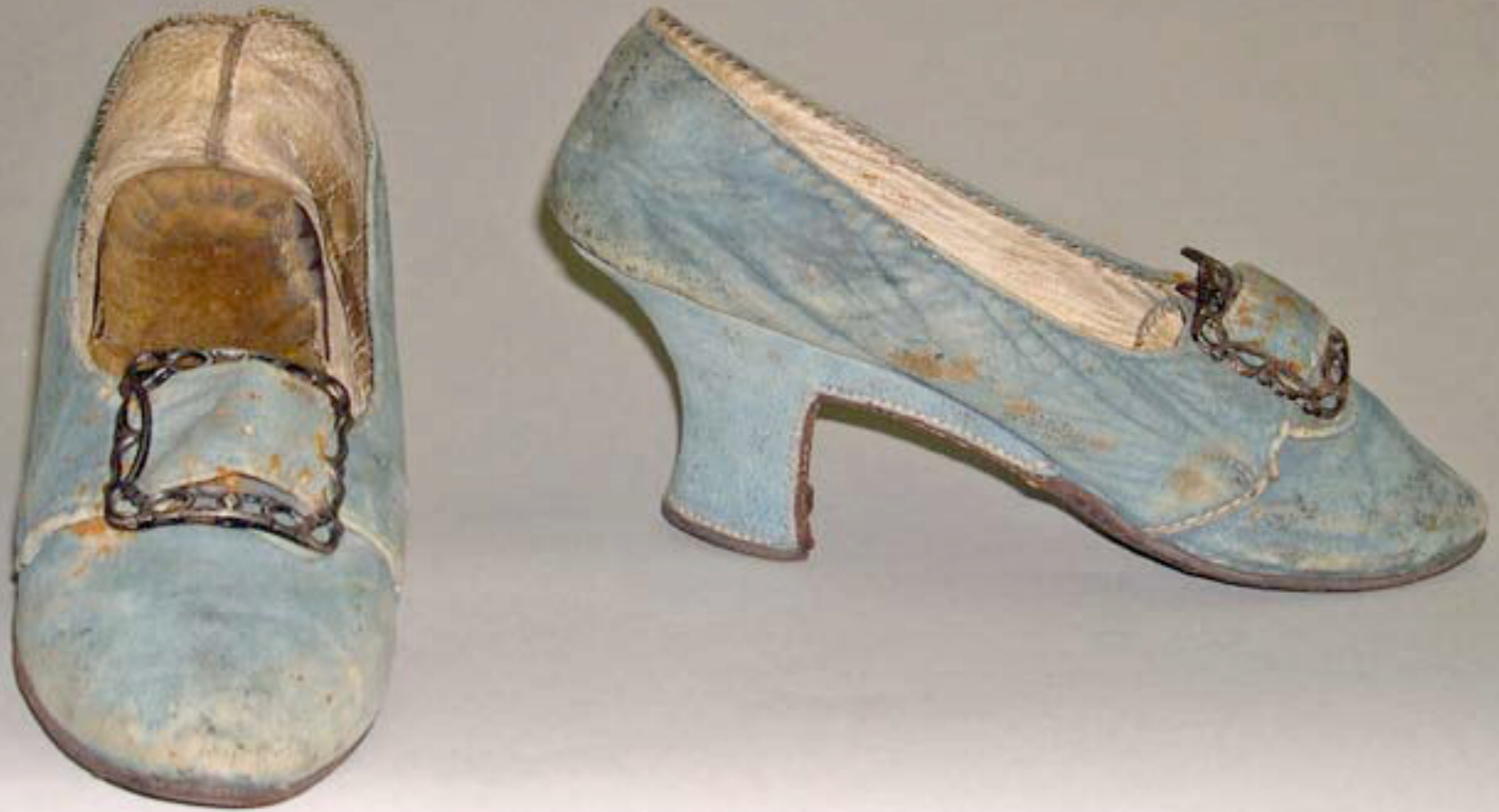
European Silk Buckle Shoes Late 18th Century (Metropolitan Museum of Art)