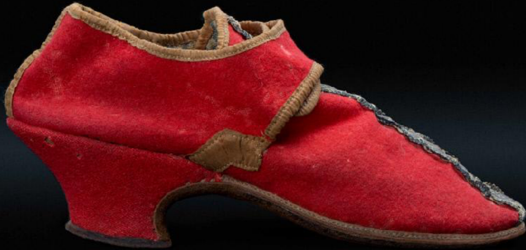
American Wool & Linen Buckle Shoes from New England c. 1750 (Colonial Williamsburg Foundation)