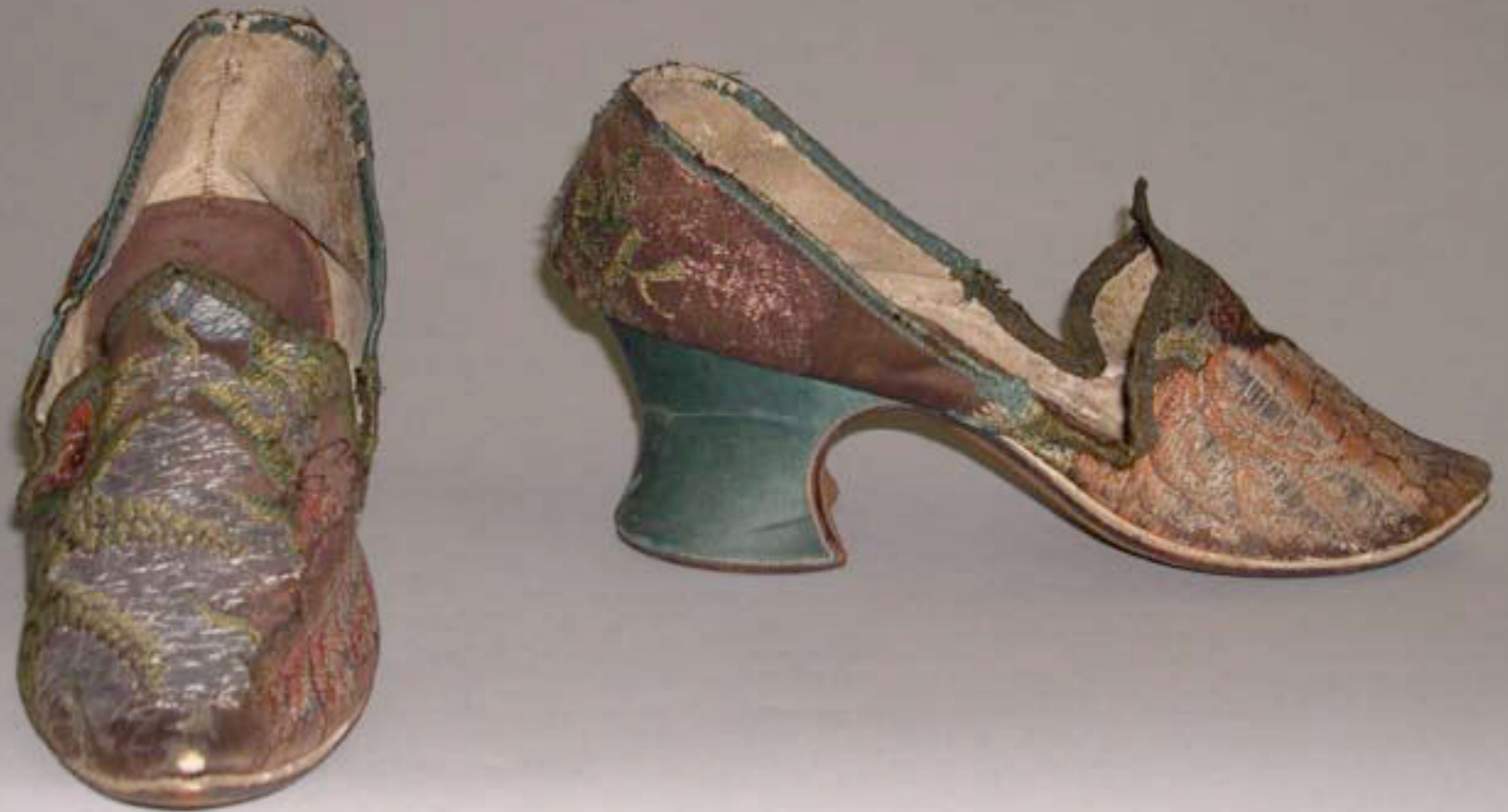
English Silk Shoes c. 1740 - 1749 (Metropolitan Museum of Art)