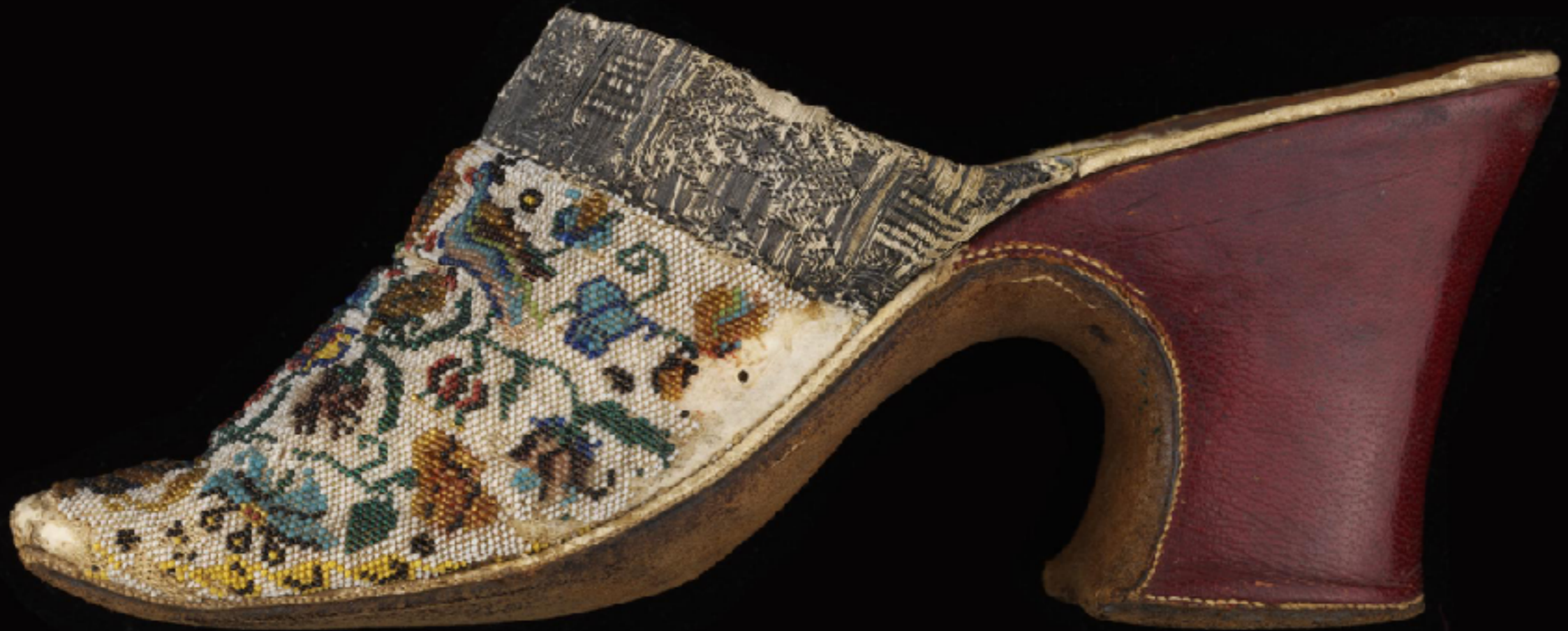
French Beaded Canvas & Leather Mule or Backless Slipper Owned by Queen Caroline, Wife of George II of England c. 1730