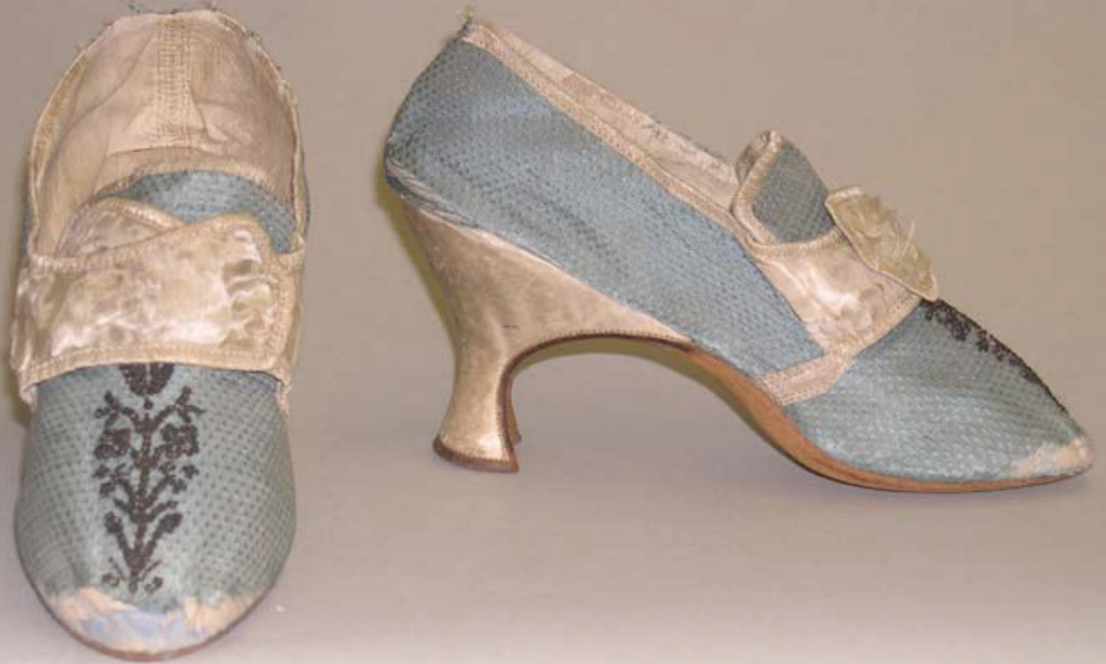
European Silk Buckle Shoes c. 1760 - 1769 (Metropolitan Museum of Art)