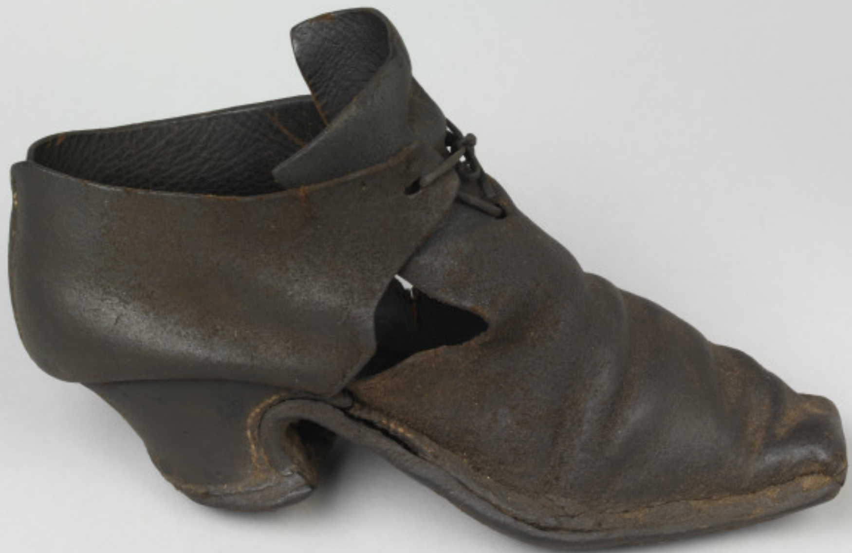
English Leather Tie Shoe c. 1640 - 1659 (Victoria & Albert)