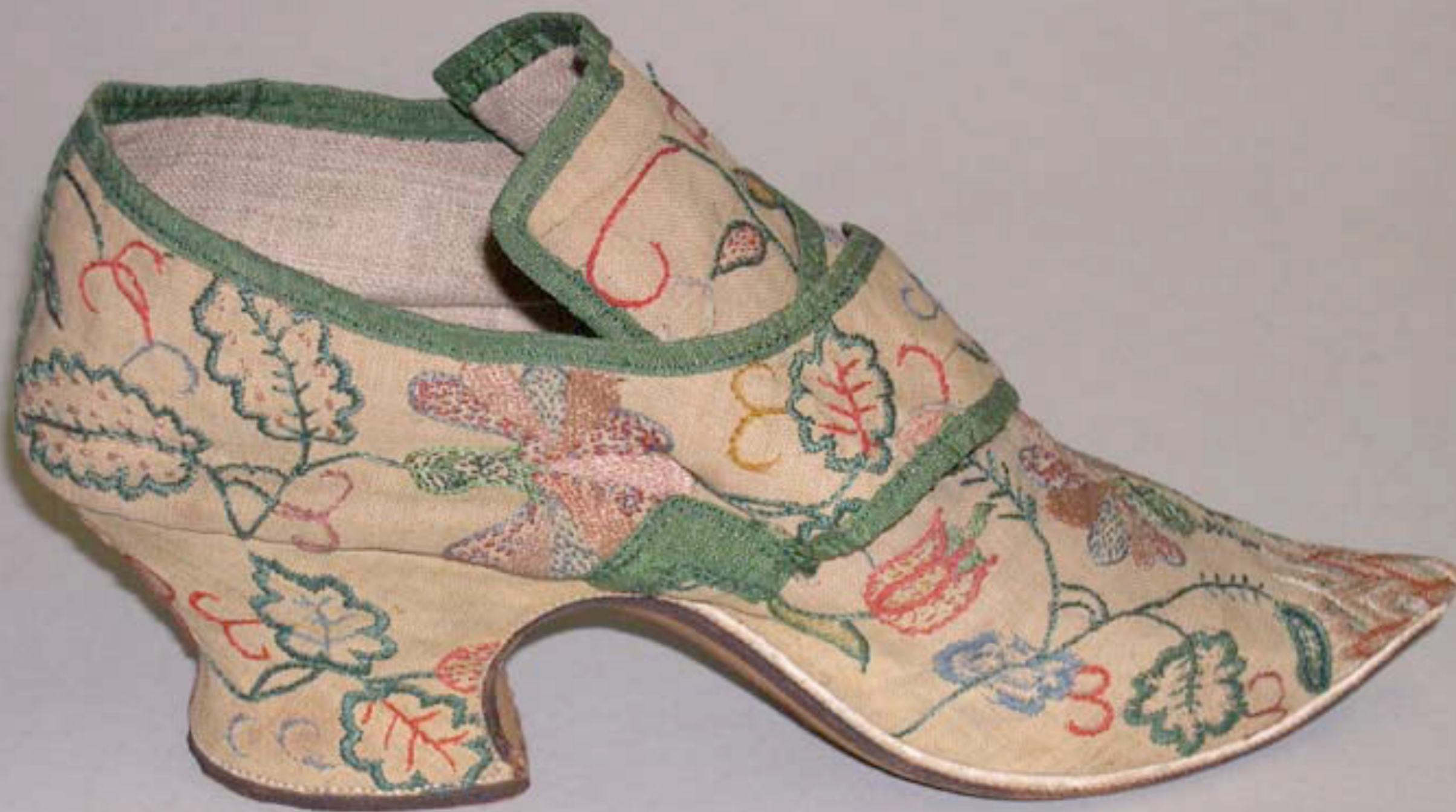
English Silk Buckle Shoes c. 1700 - 1720 (Metropolitan Museum of Art)