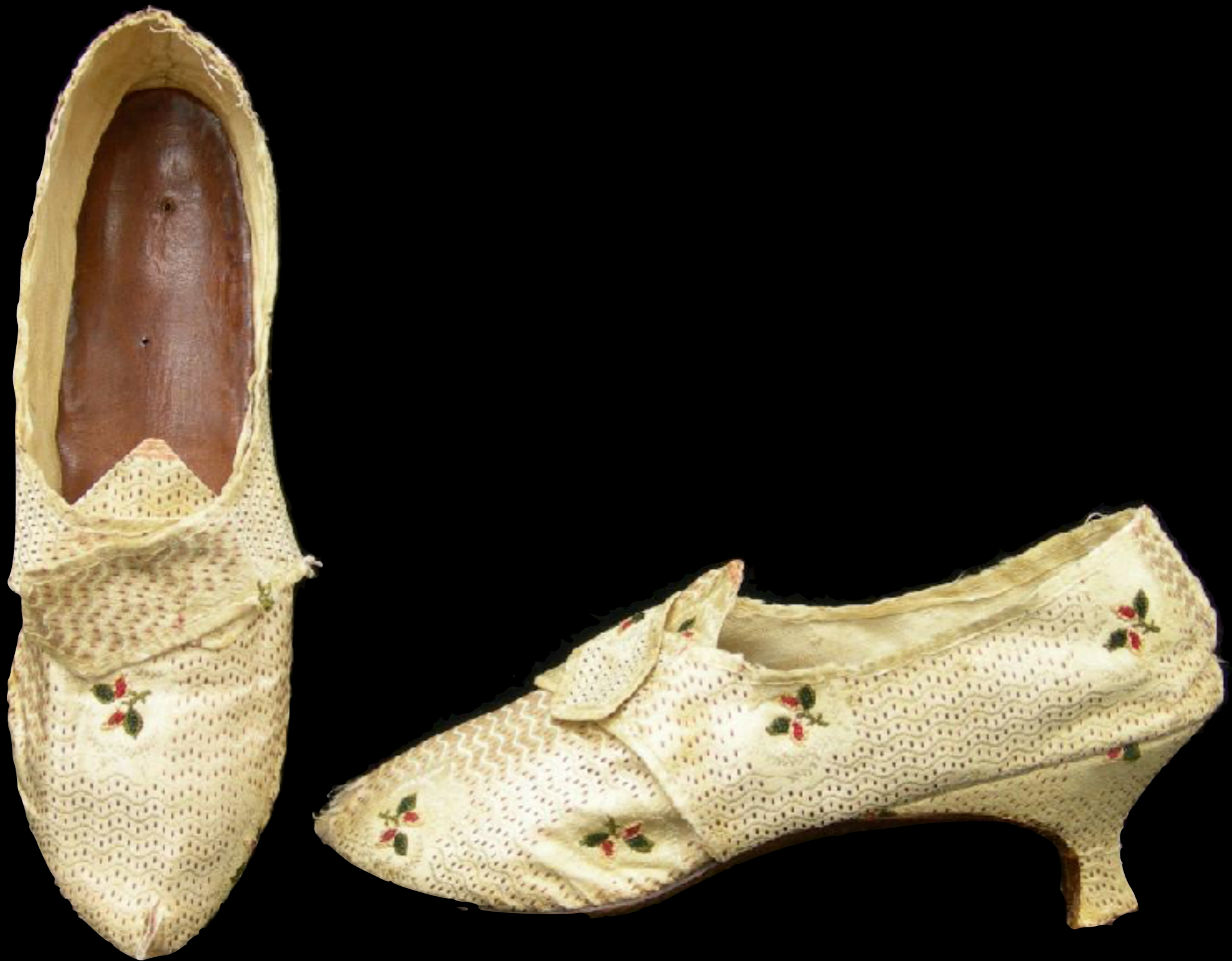
English Brocaded Silk Buckle Shoes c. 1780 - 1785 (Colonial Williamsburg Foundation)