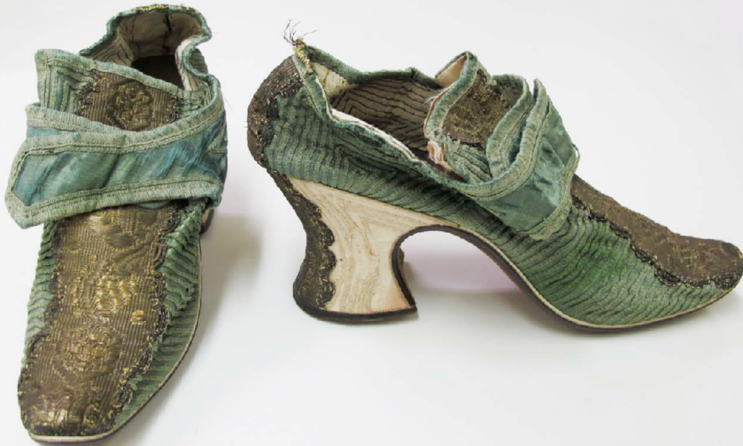
European Silk Buckle Shoes Early 18th Century (Metropolitan Museum of Art)