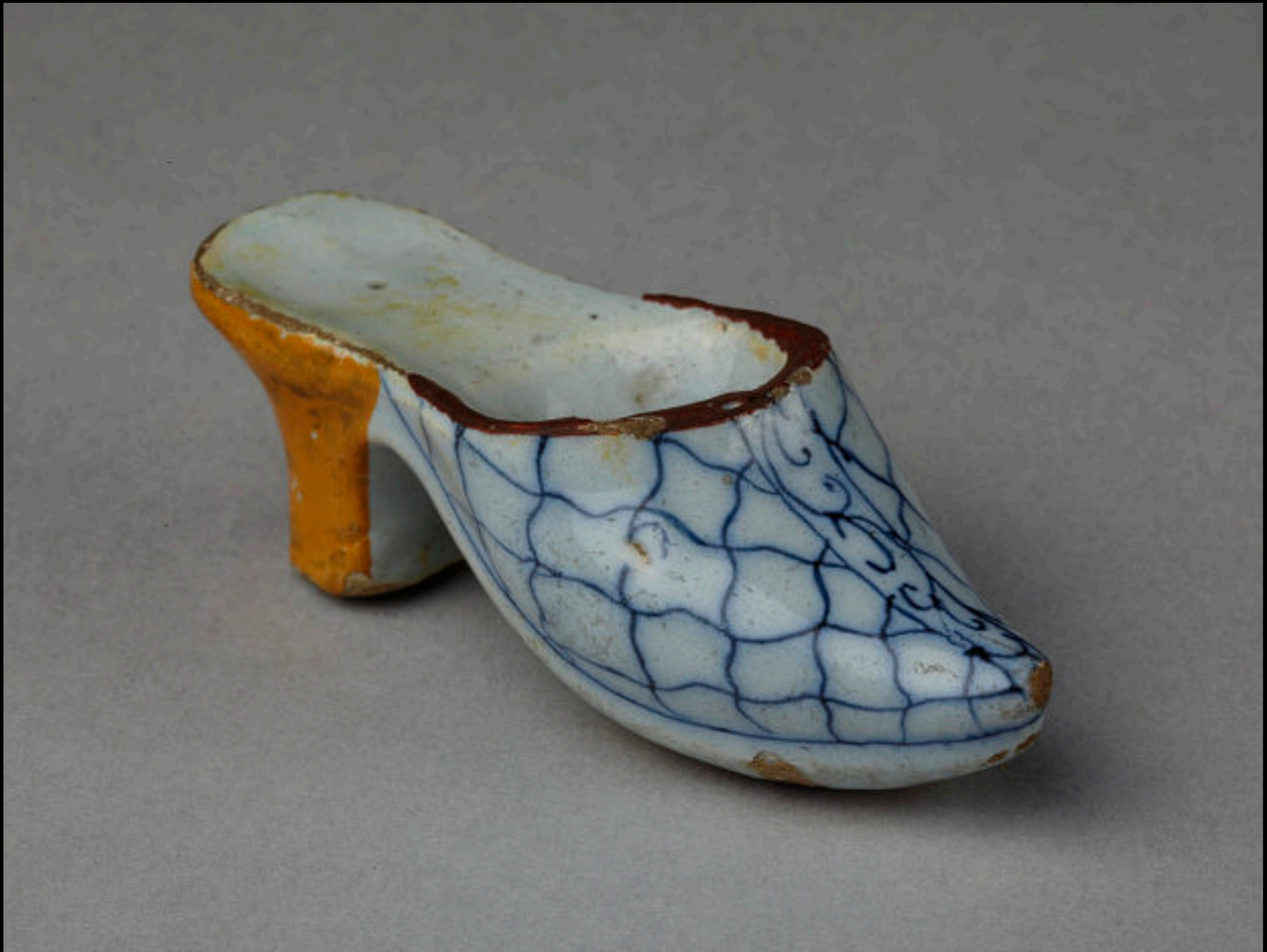
Dutch Tin Glazed Earthenware Slipper or "Mule" 18th Century (Victoria & Albert Museum)