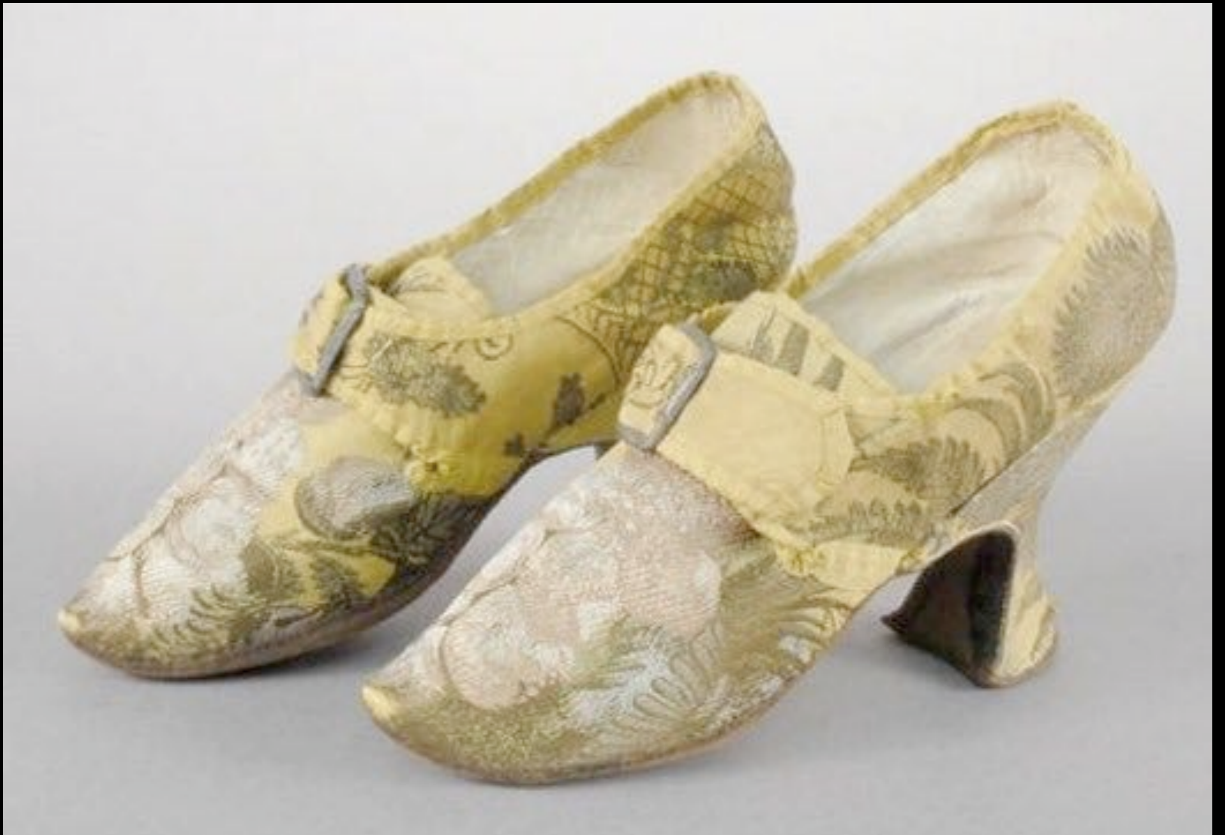
Silk Buckle Shoes Mid 18th Century (Private Collection)