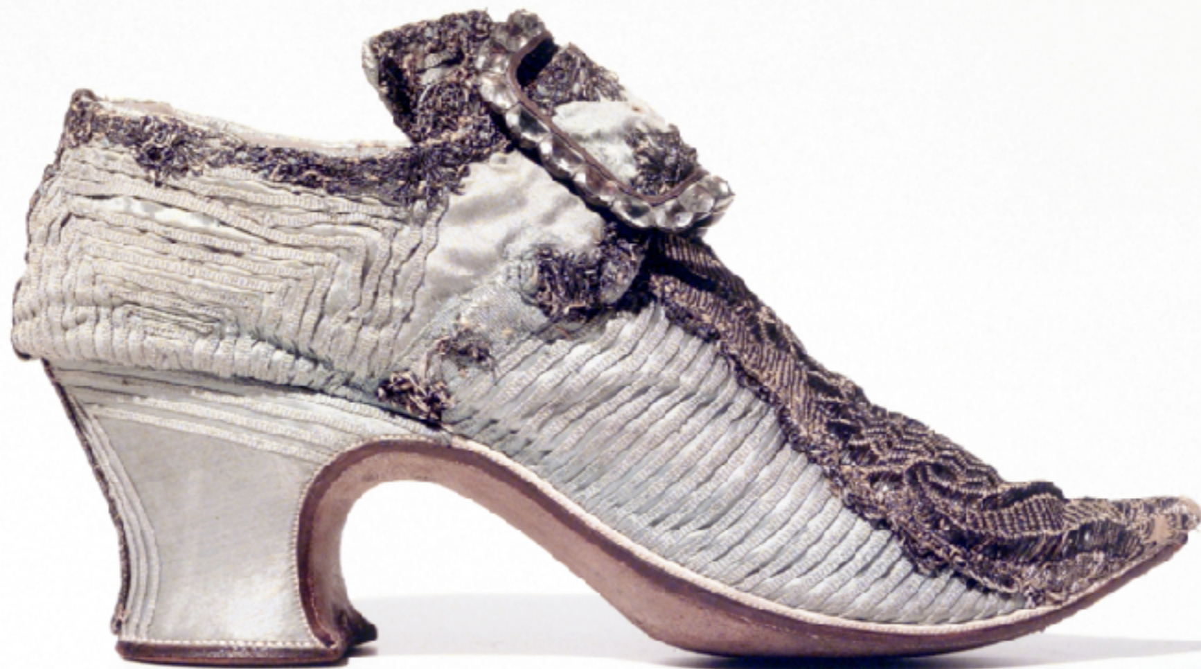
English Metallic Lace & Silk Buckle Shoes