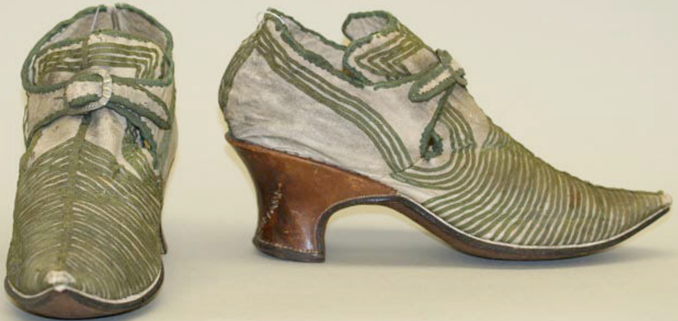
European Silk Buckle Shoes c. 1690 - 1710 (Metropolitan Museum of Art)