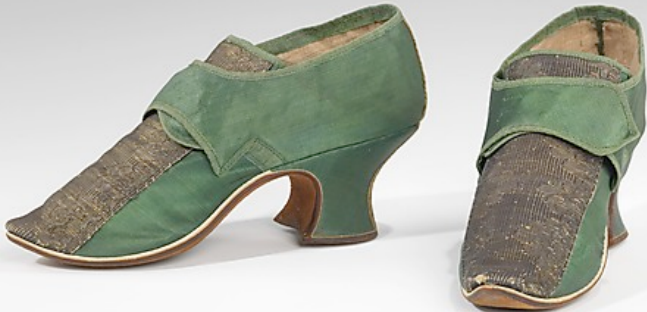
English Metallic Lace & Silk Buckle Shoes