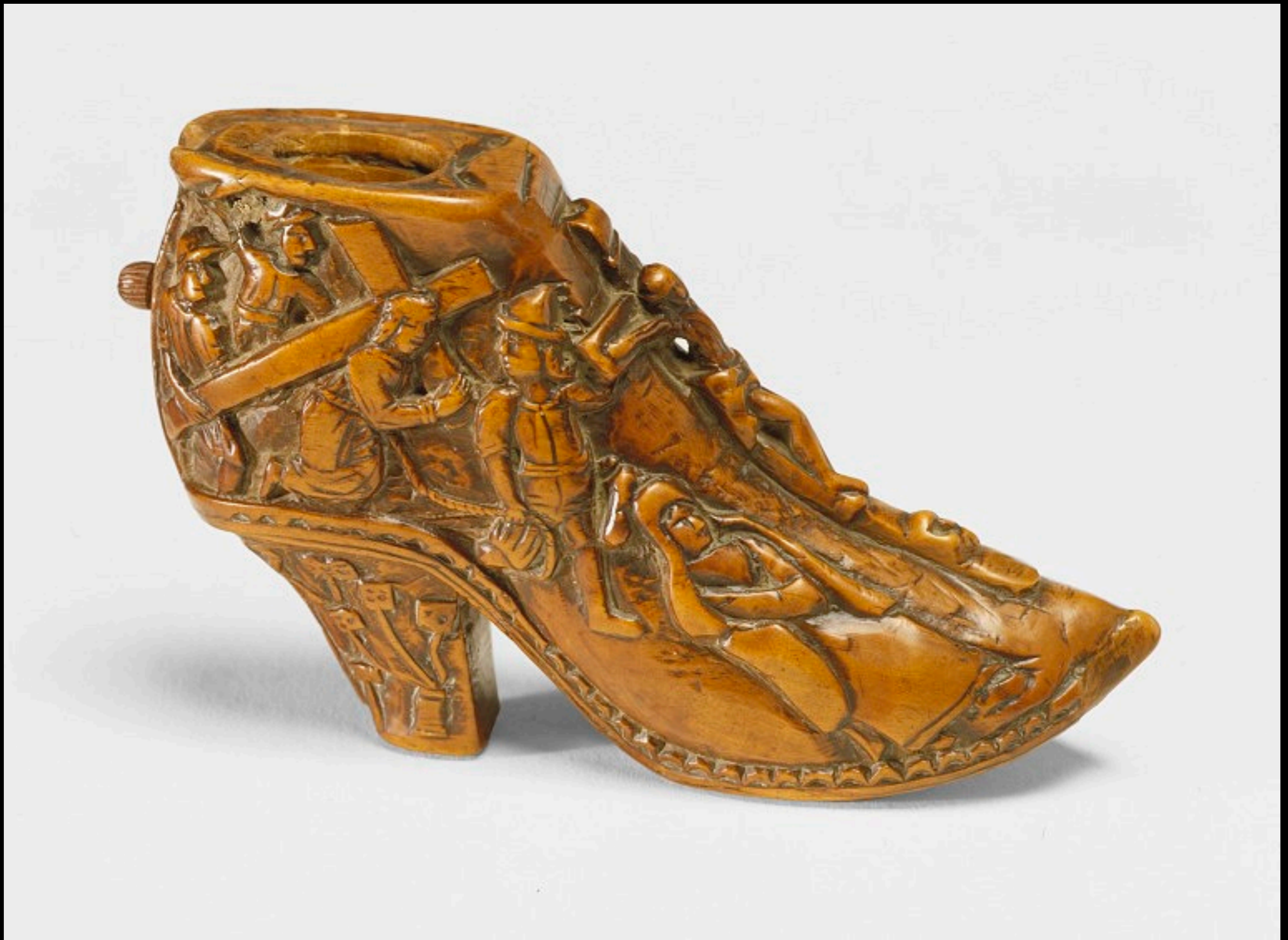
German Snuff Box c. 1720 - 1740 (Victoria & Albert Museum)