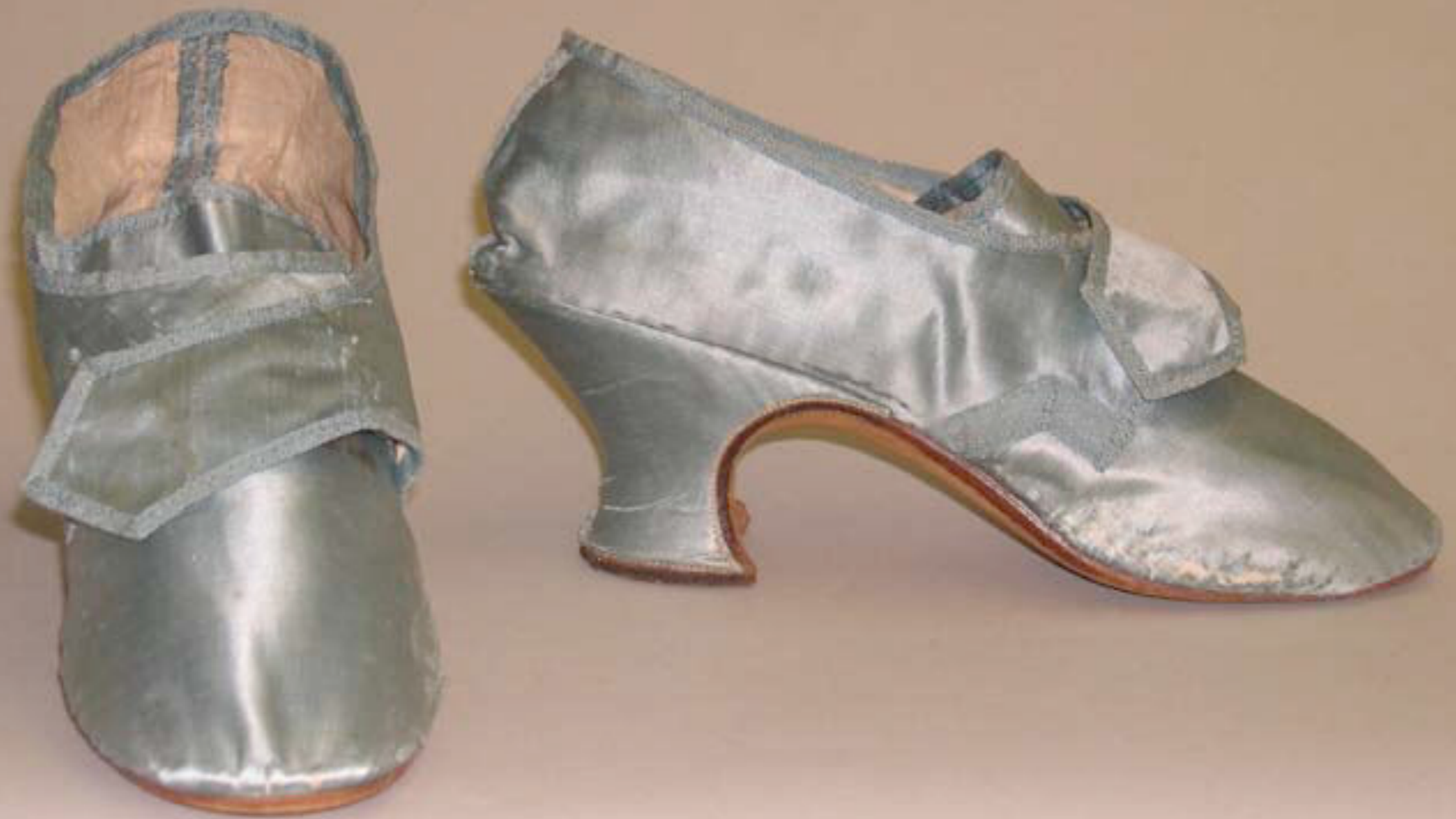
European Silk Buckle Shoes c. 1760 - 1769 (Metropolitan Museum of Art)