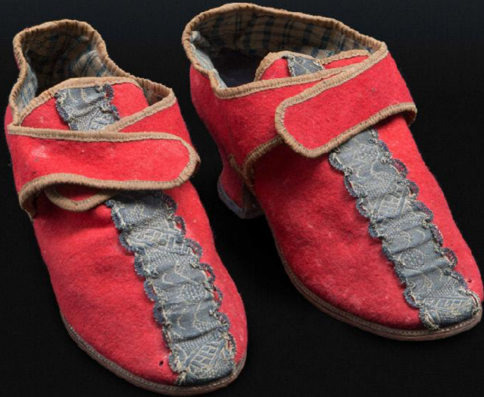
American Wool & Linen Buckle Shoes from New England c. 1750 (Colonial Williamsburg Foundation)