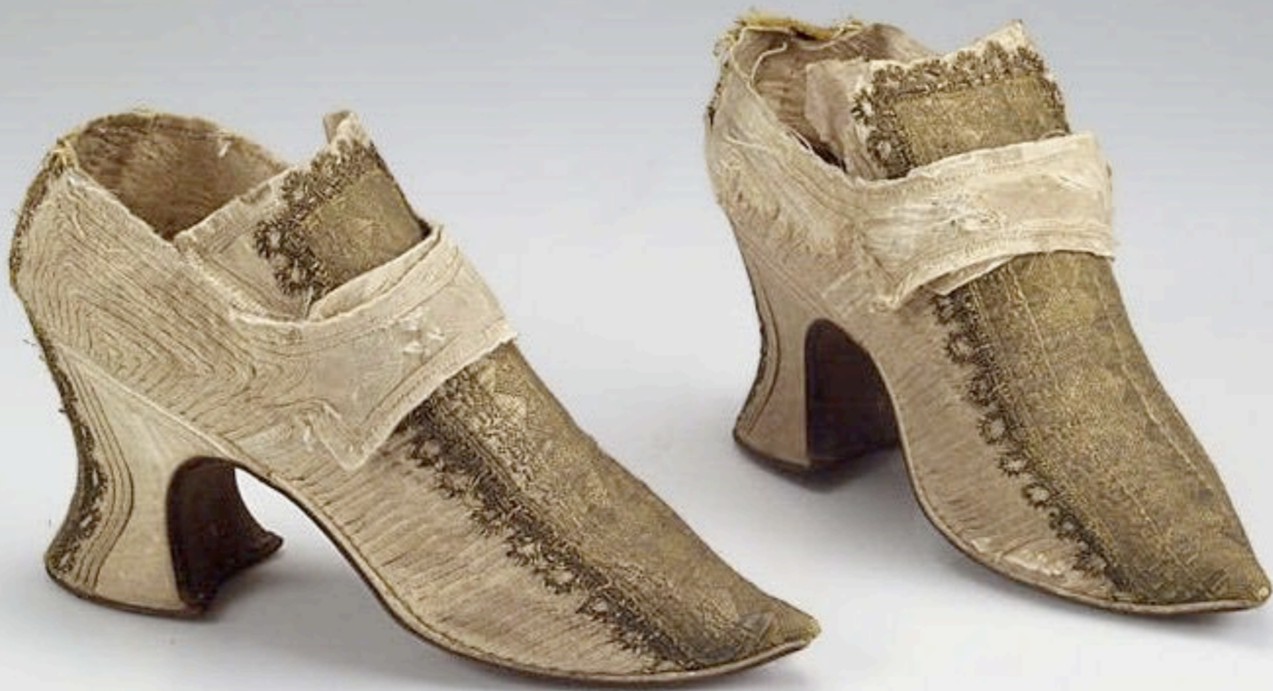
Silk Buckle Shoe Mid 18th Century (Private Collection)