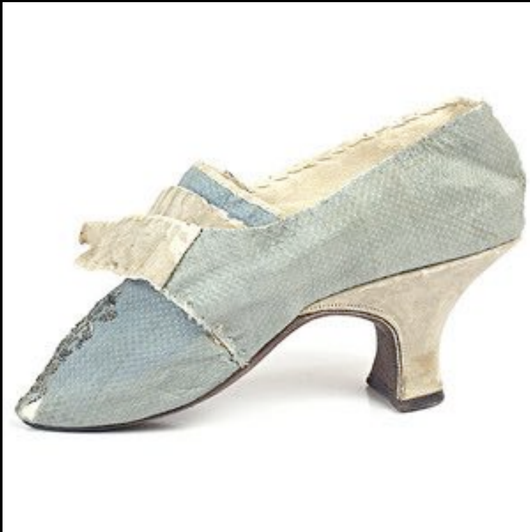
Silk Buckle Shoe Mid 18th Century (Private Collection)