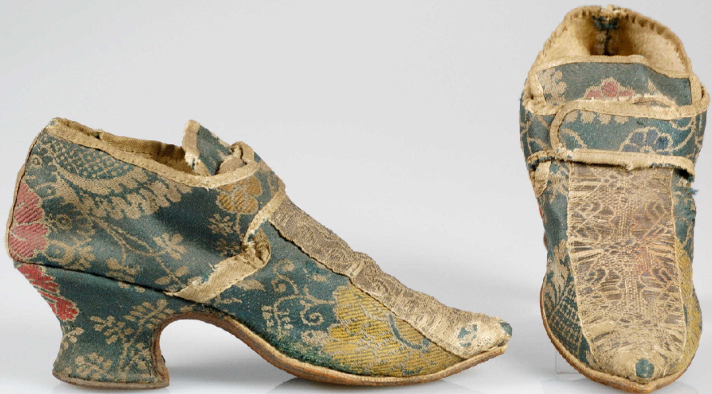
European Silk Buckle Shoes c. 1720 - 1739 (Metropolitan Museum of Art)