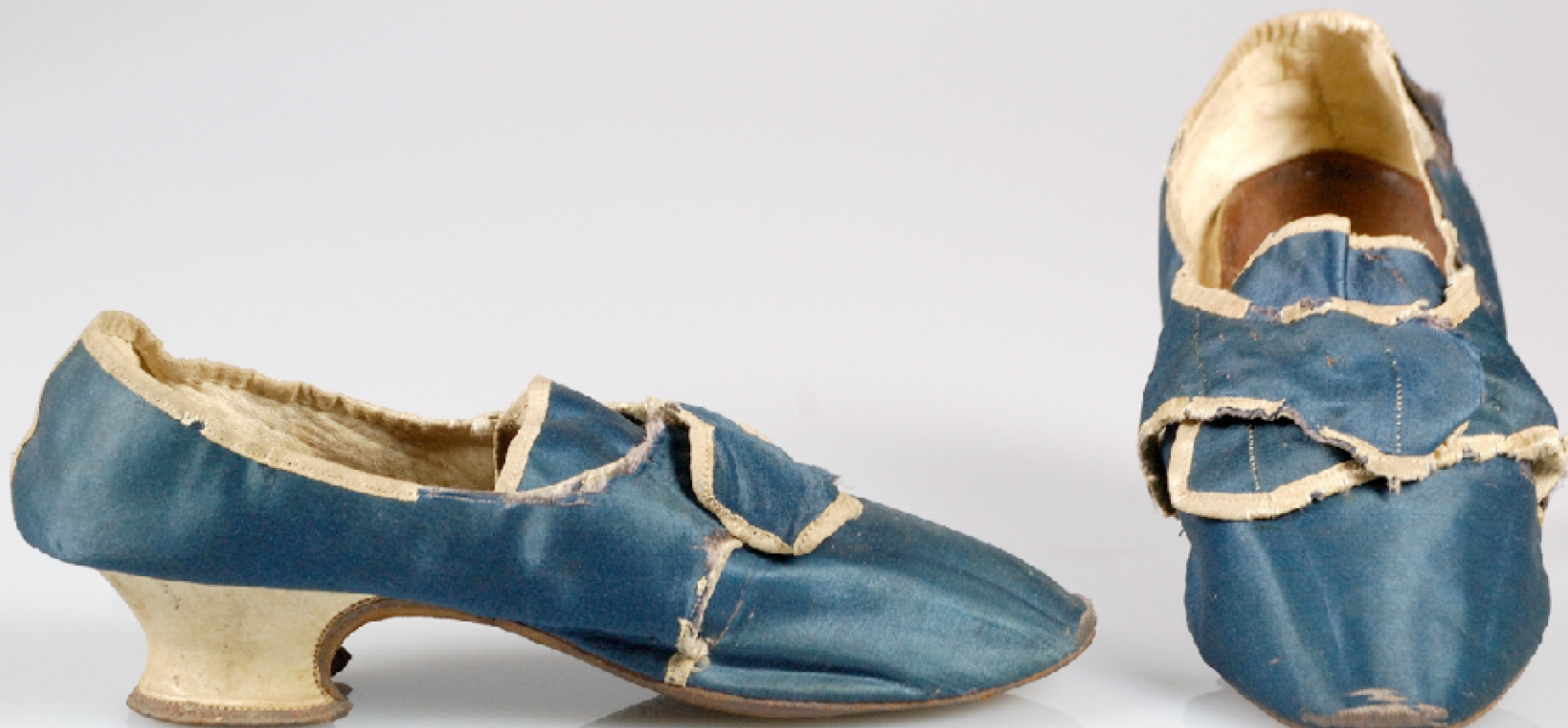
European Silk Buckle Shoes c. 1755 - 1785 (Metropolitan Museum of Art)