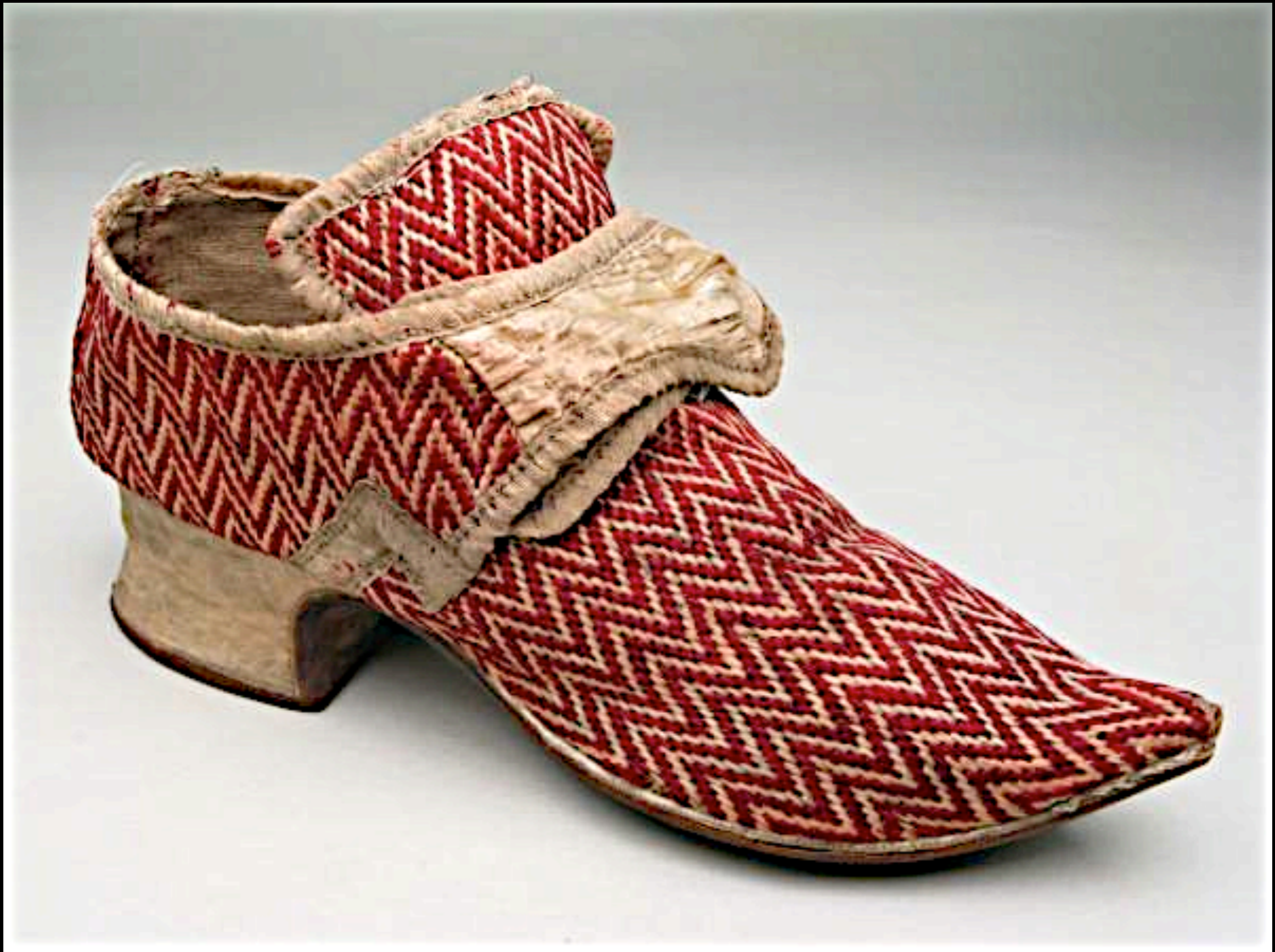
English Needlepoint Canvas and Silk Shoe c. 1735 - 1760