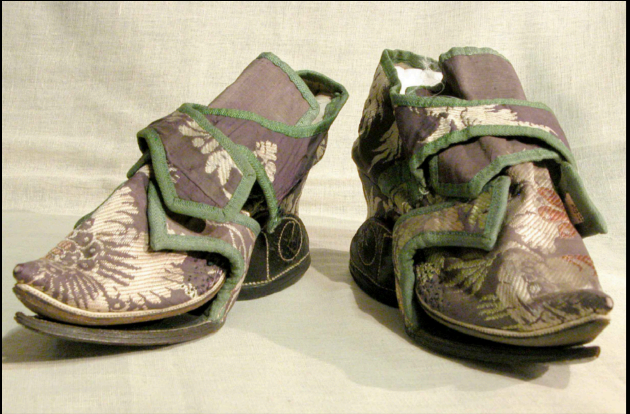
English Silk & Leather Clogs with Matching Shoes