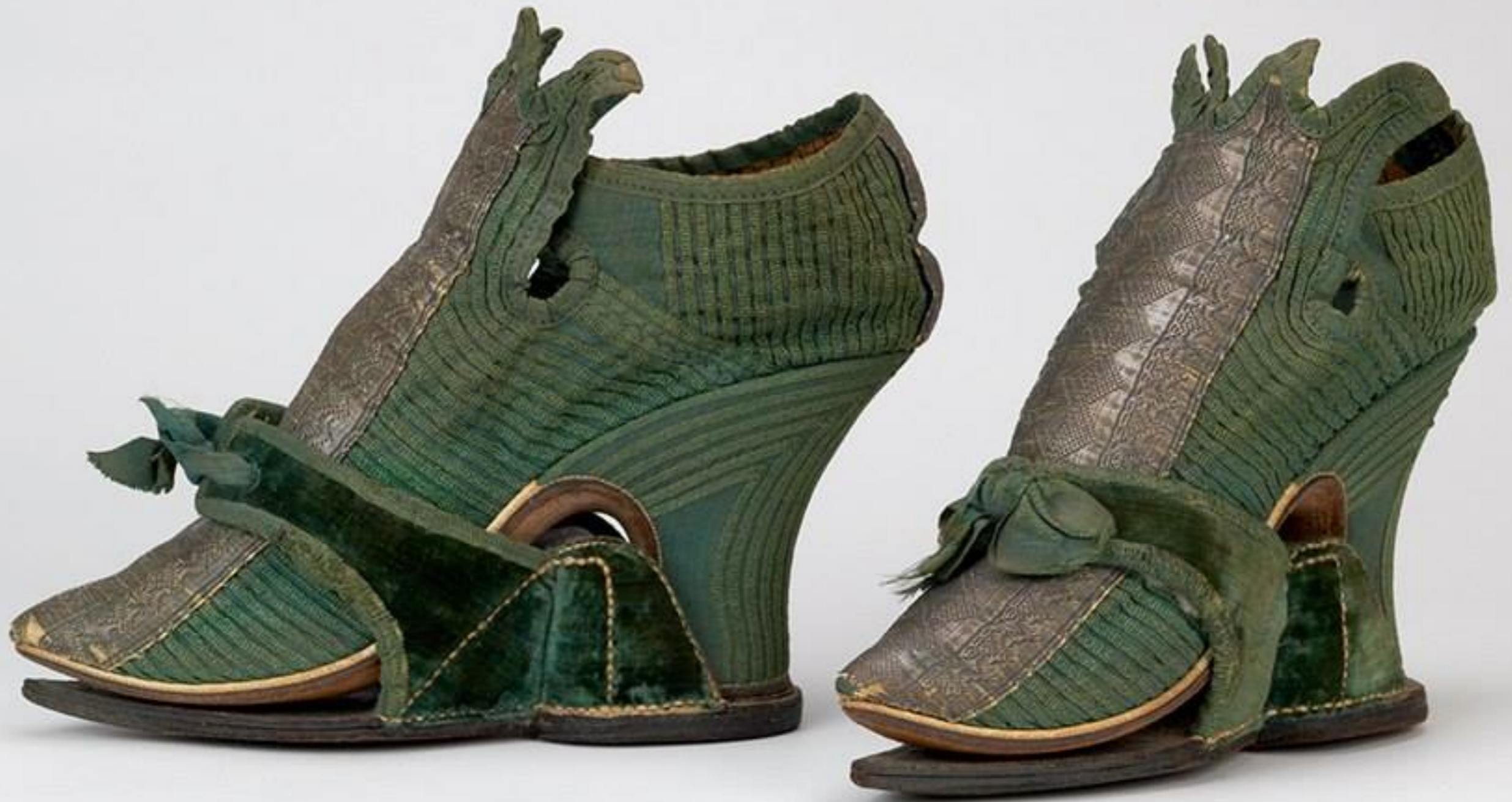
English Velvet & Leather Clogs with Matching Shoes