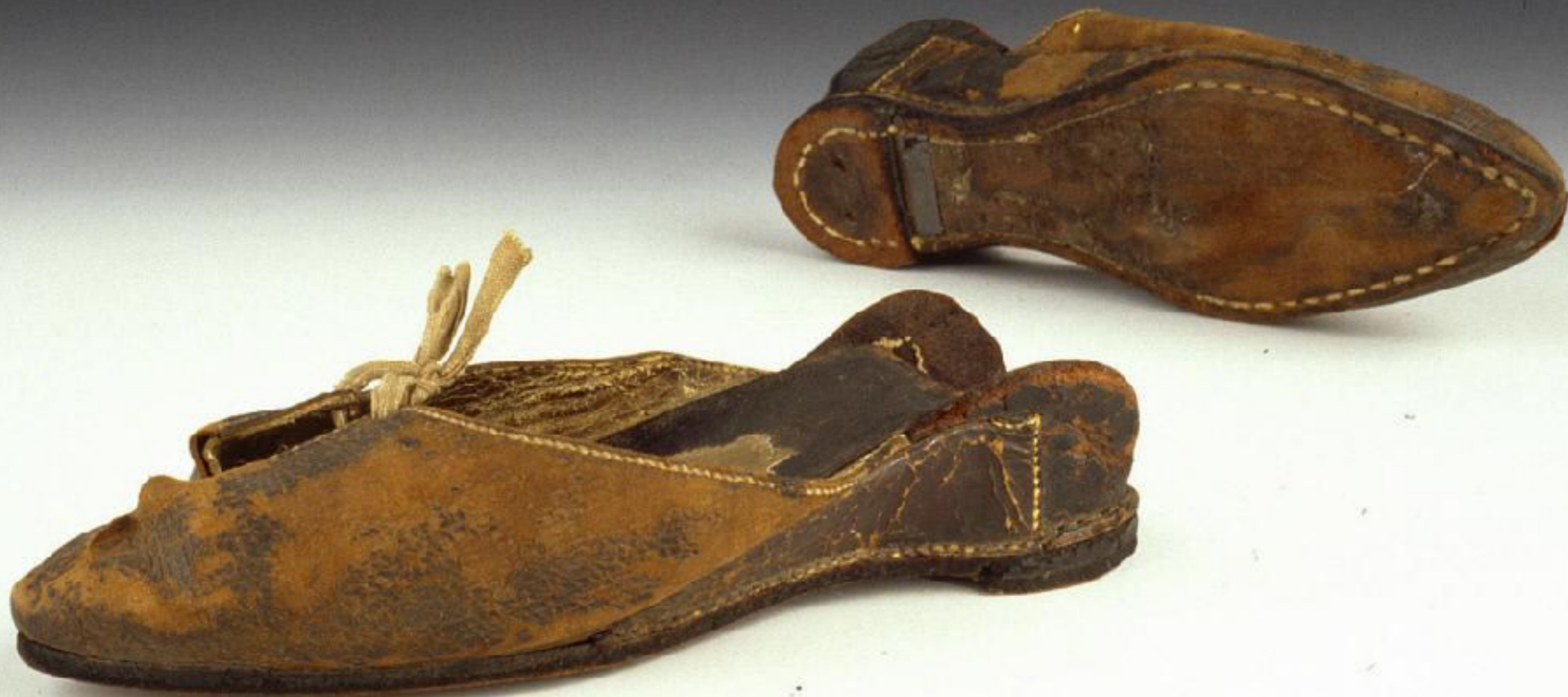
English Leather Clogs c. 1765 - 1775