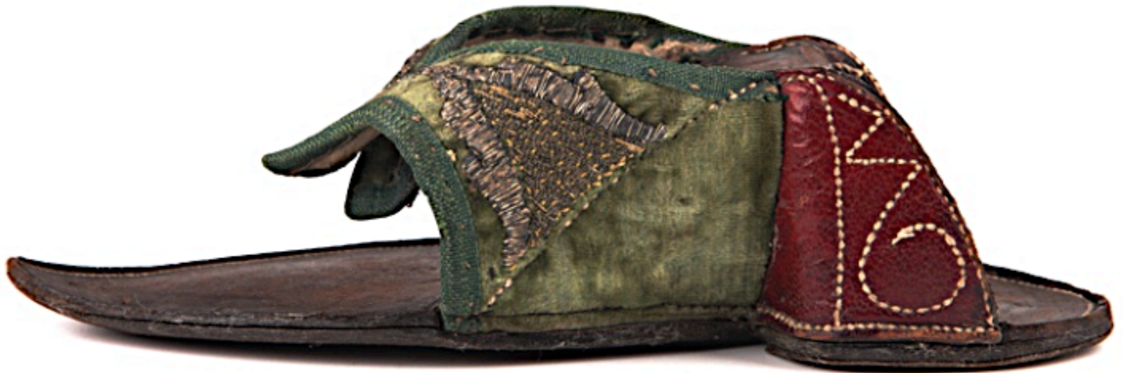
English Silk & Leather Clog