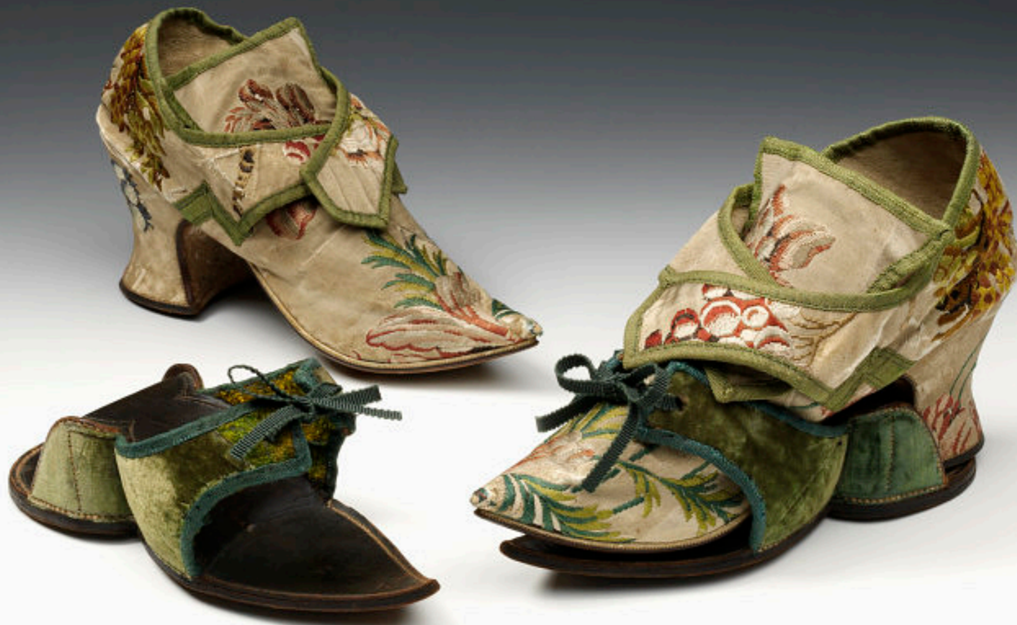
English Green Velvet & Leather Clogs with Matching Shoes