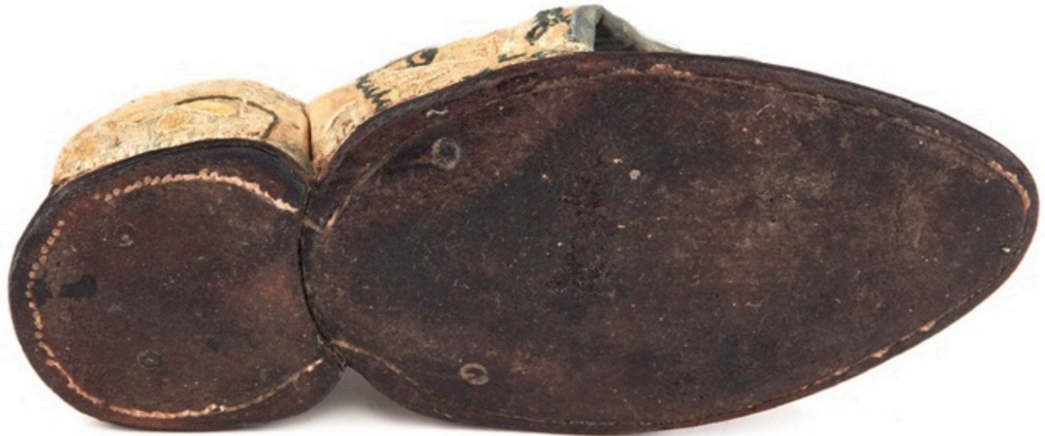
English Silk Brocade & Leather Clog