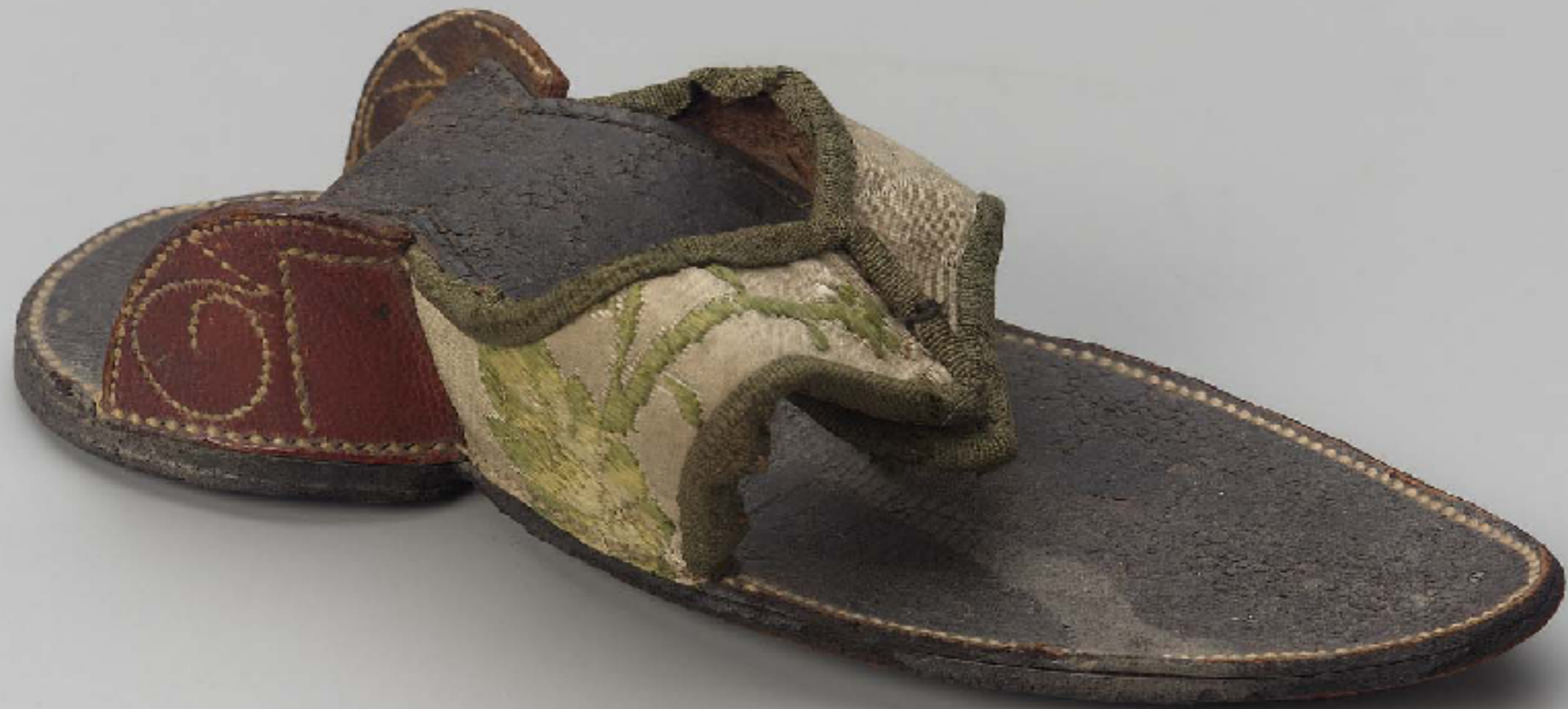
English Silk & Leather Clog c. 1700 - 1750 (Museum of Fine Arts, Boston)