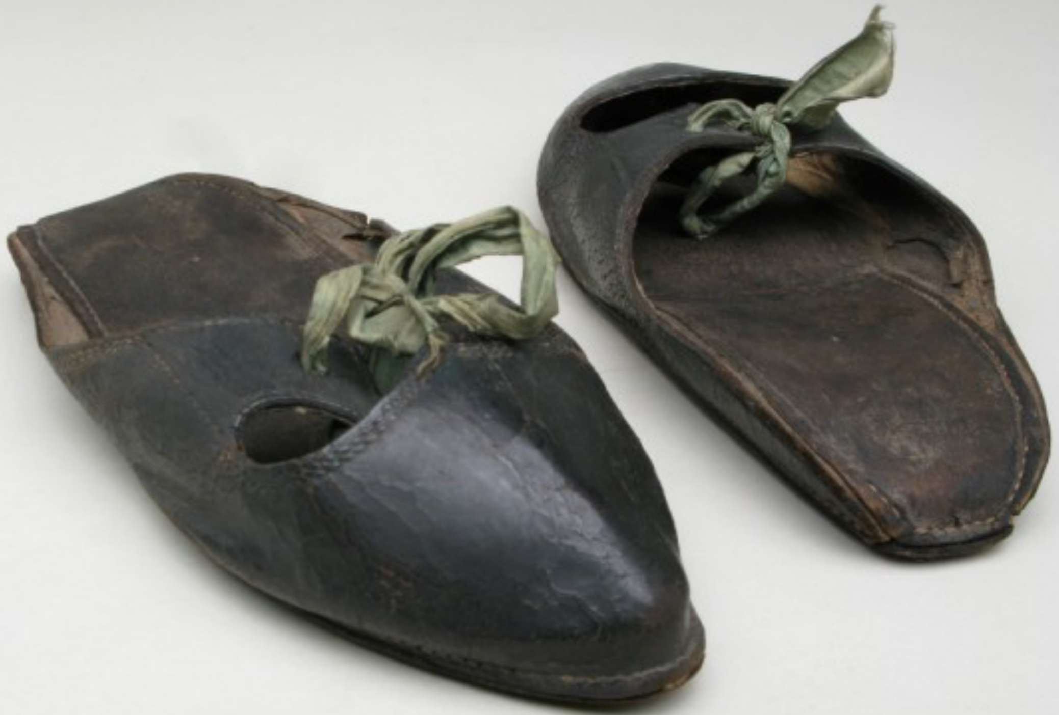
English Leather Clogs c. 1780 - 1800 (Manchester Art Gallery)