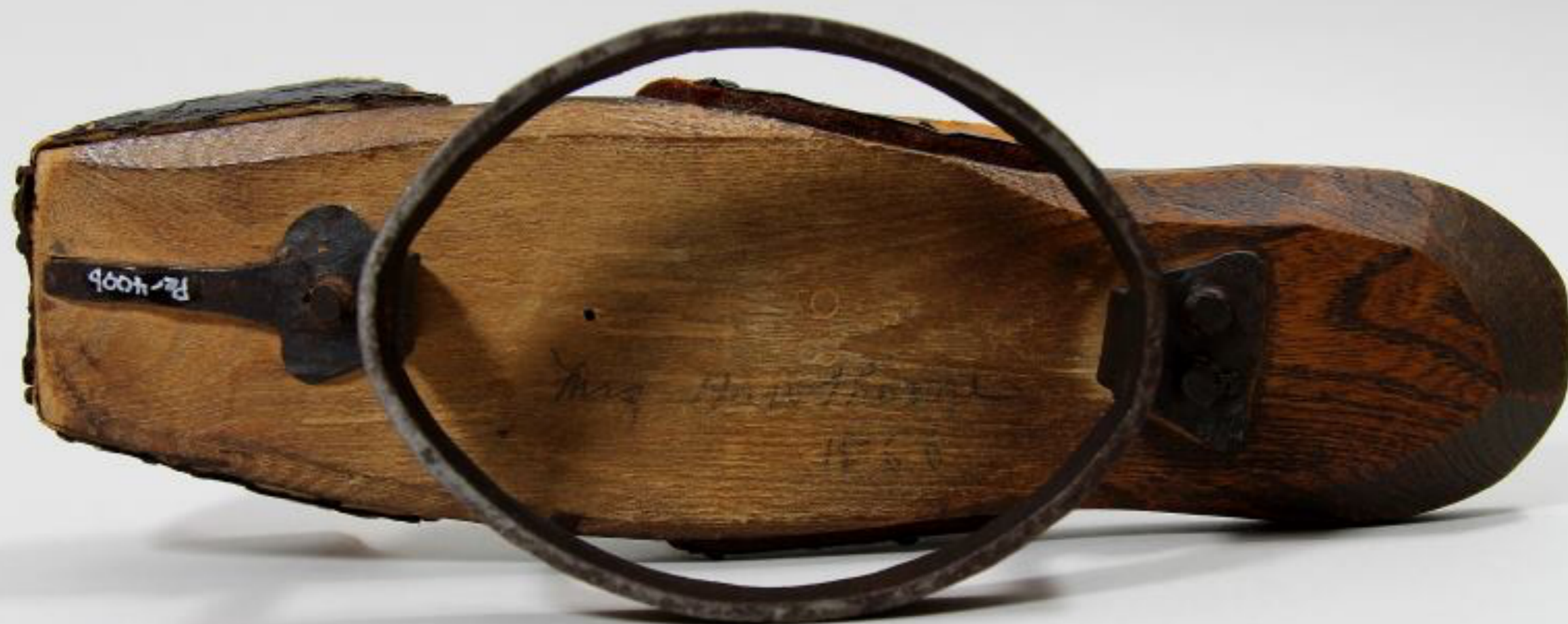
Wood, Leather, & Iron Ring Patten Mid to Late 18th Century (Concord Museum)