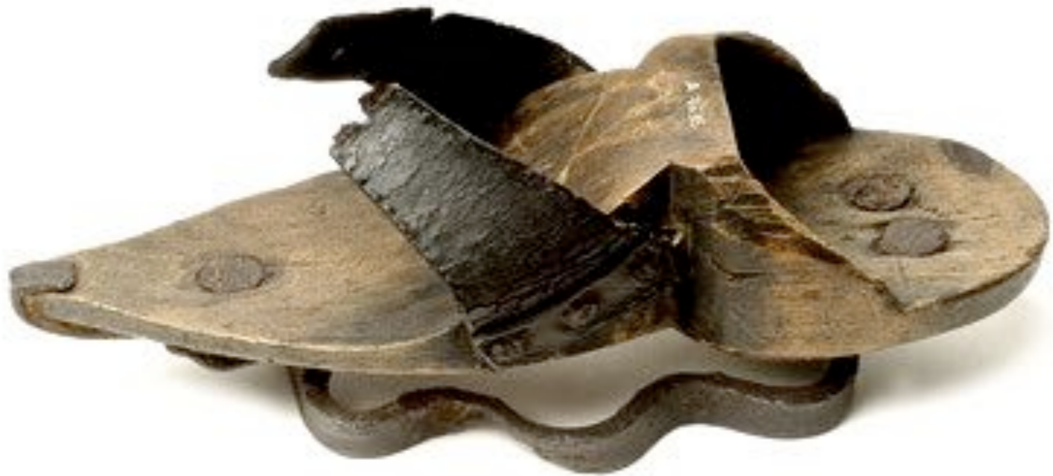
English Wood, Leather & Iron Ring Patten