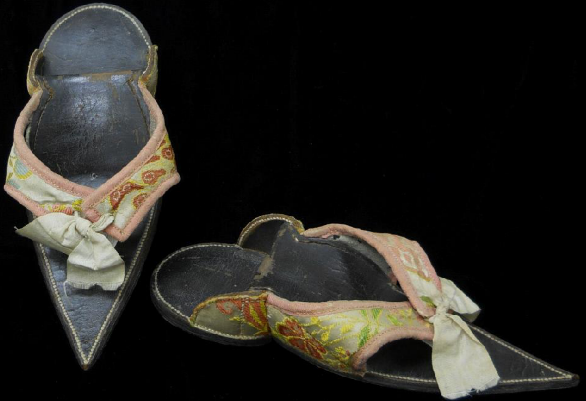
English Silk & Leather Clogs c. 1720 - 1730