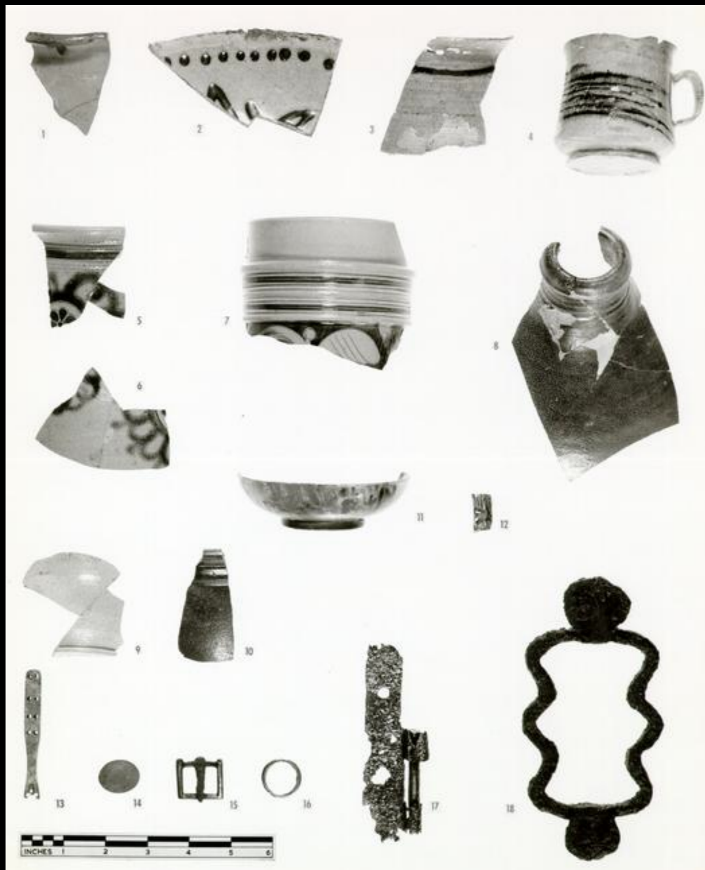
Iron Ring from a Patten (Lower Right)

Artifacts from Cellar Hole on Lot K, Deposited Between 1782 and 1790