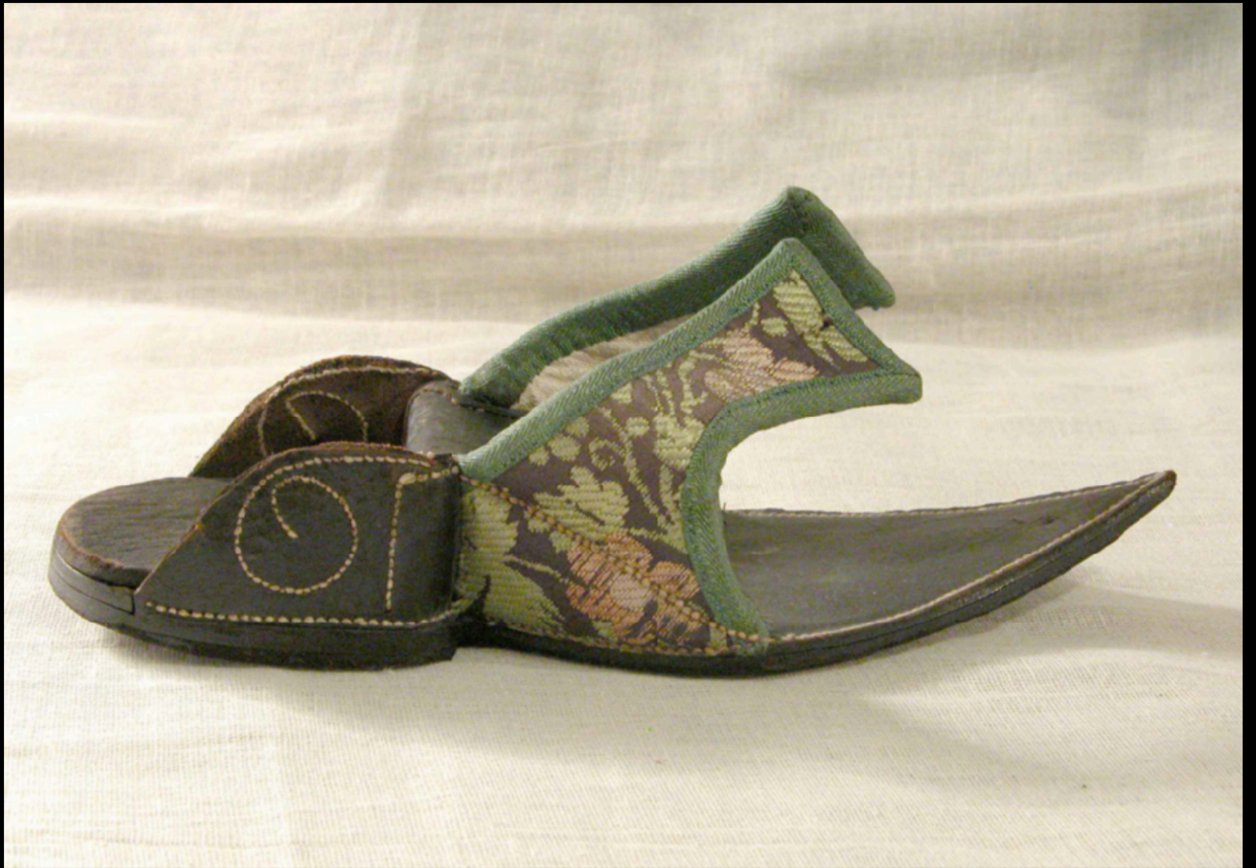
English Silk & Leather Clog c. 1720 (National Trust / Killerton, Devon)