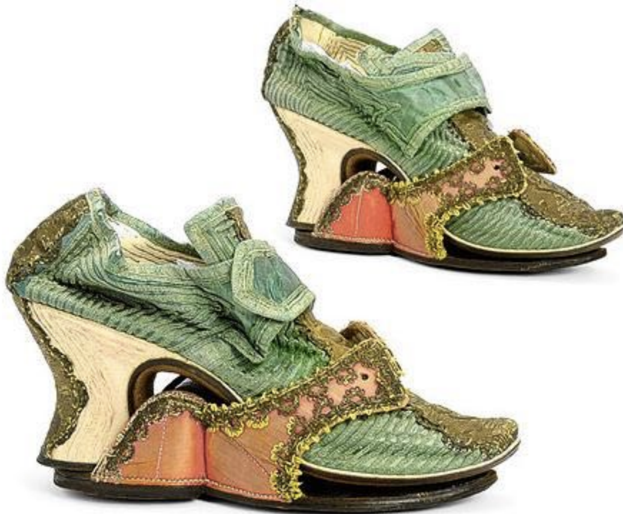
English Silk & Leather Clogs with Matching Shoes c. 1700 - 1750 (Private Collection)