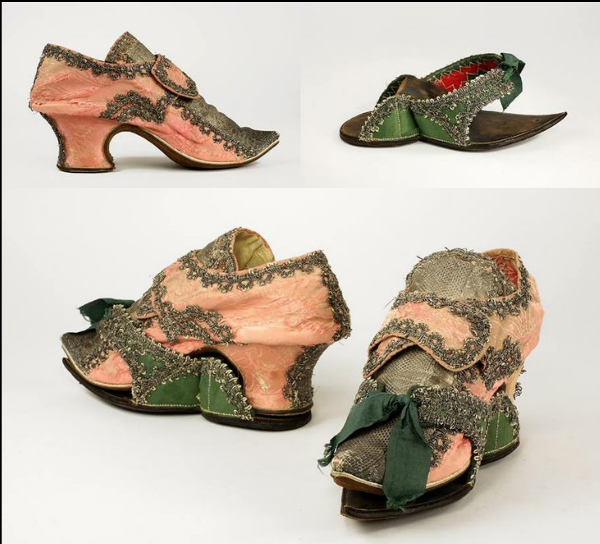
English Silk & Leather Clogs with Matching Shoes Early 18th Century (Bata Shoe Museum)