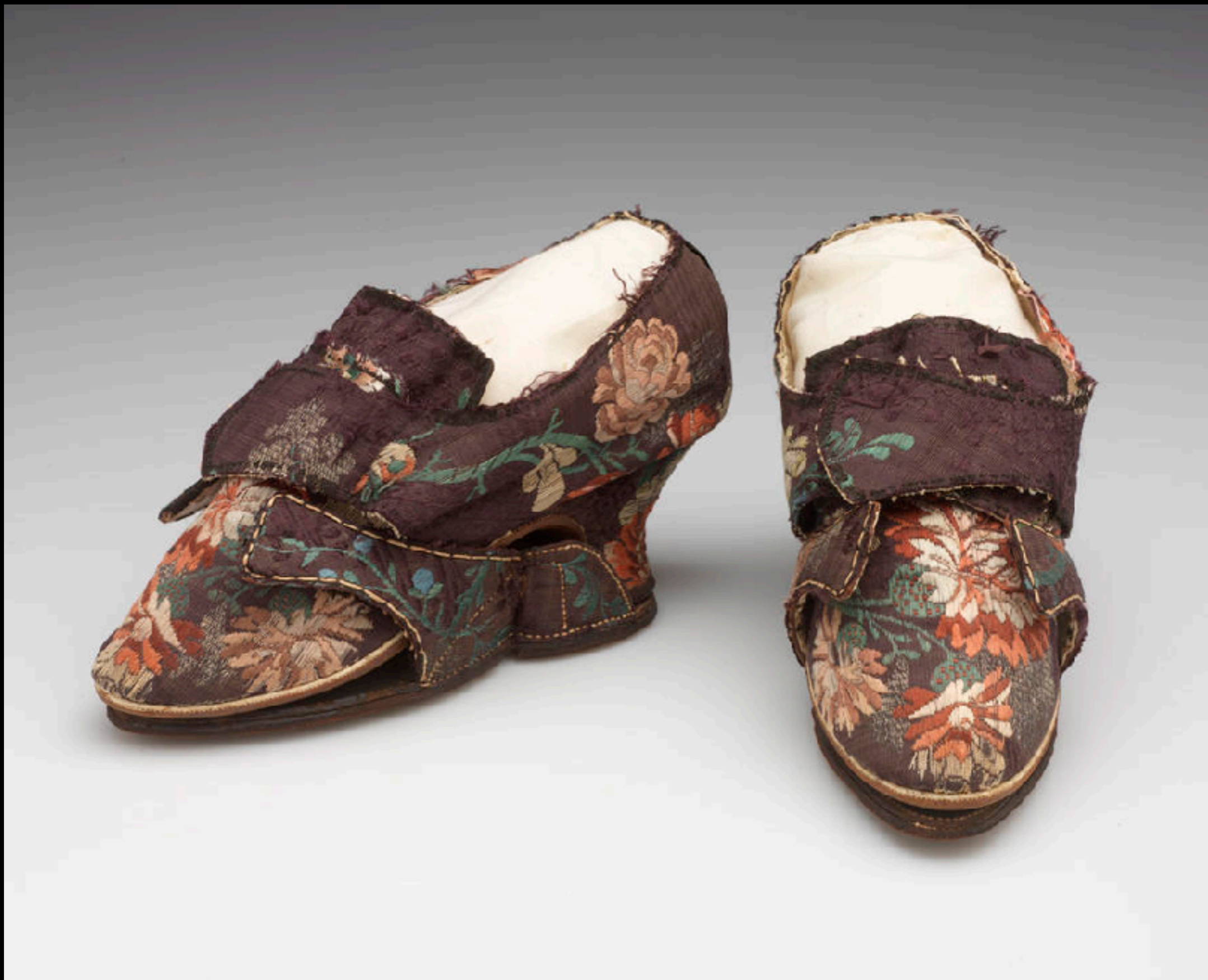
English Silk & Leather Clogs with Matching Shoes