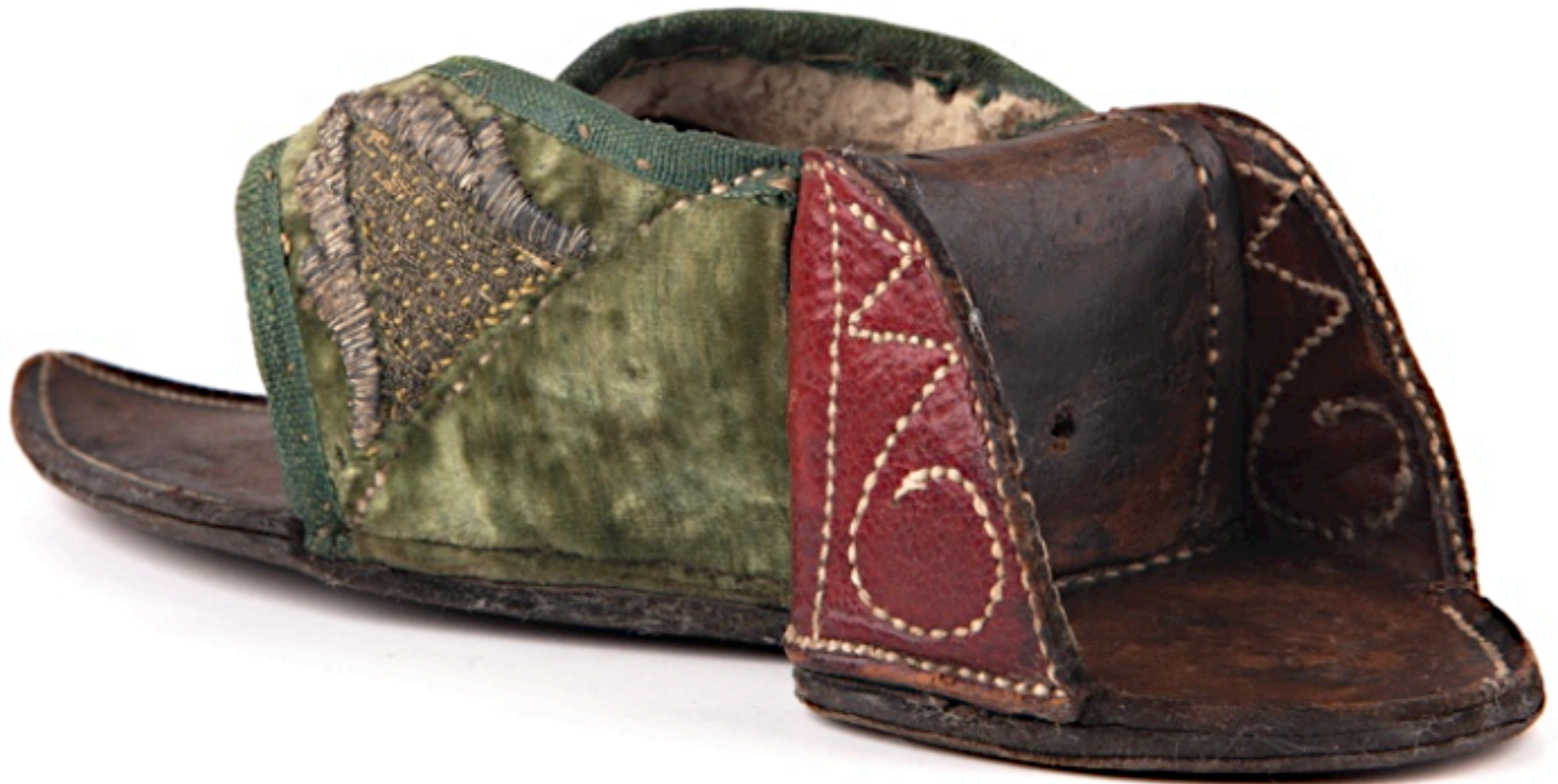
English Silk & Leather Clog