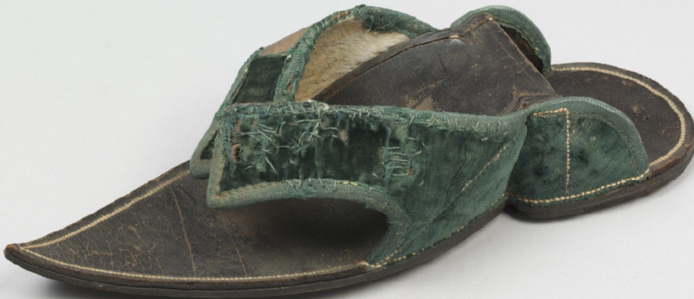
European Velvet & Leather Clog