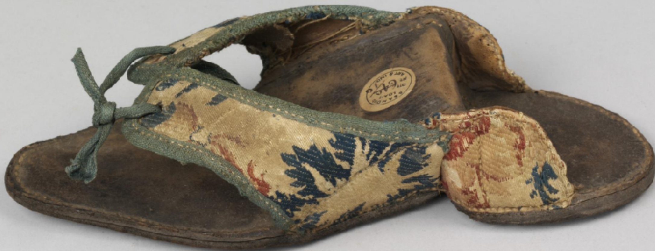
English Silk & Leather Clogs c. 1780 - 1790 (Victoria & Albert)