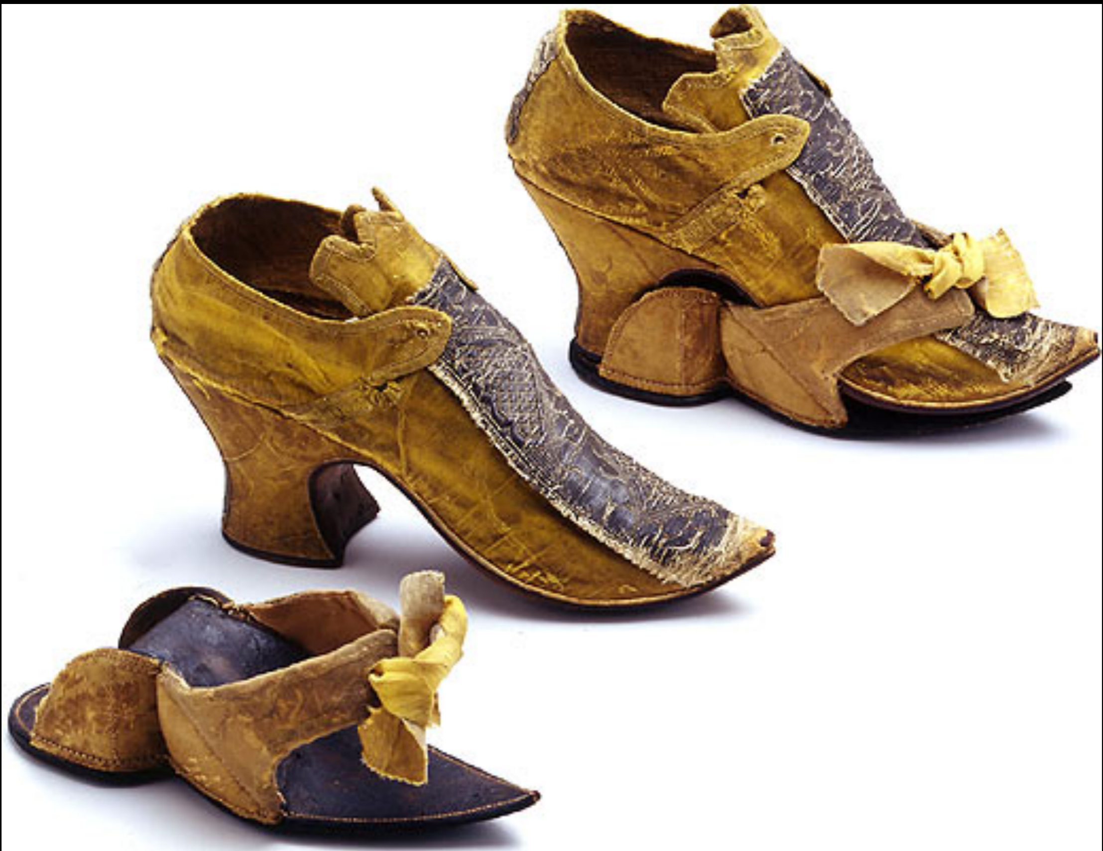
German Silk & Leather Clogs with Matching Shoes Early 18th Century (Württemberg State Museum)