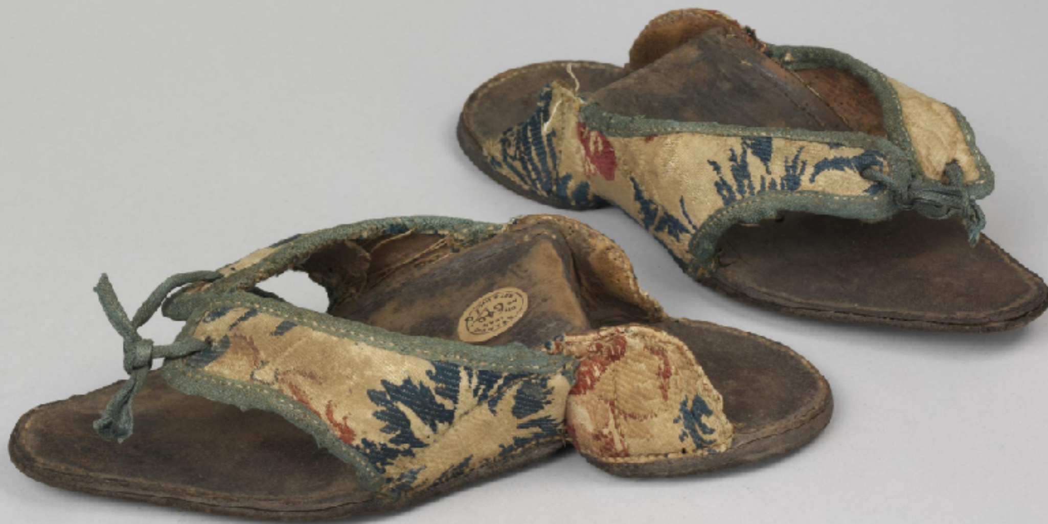
European Silk & Leather Clogs