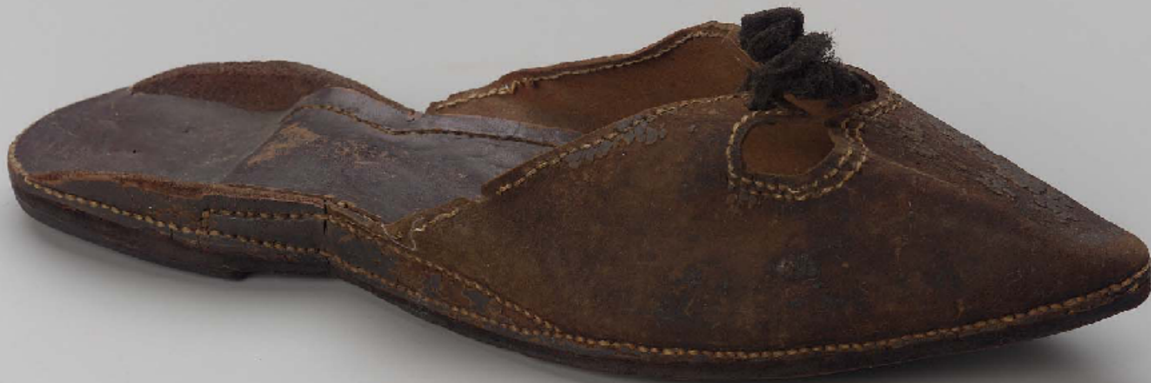
English Leather Clog Worn in Lexington, Massachusetts Late 18th - Early 19th Century (Museum of Fine Arts, Boston)