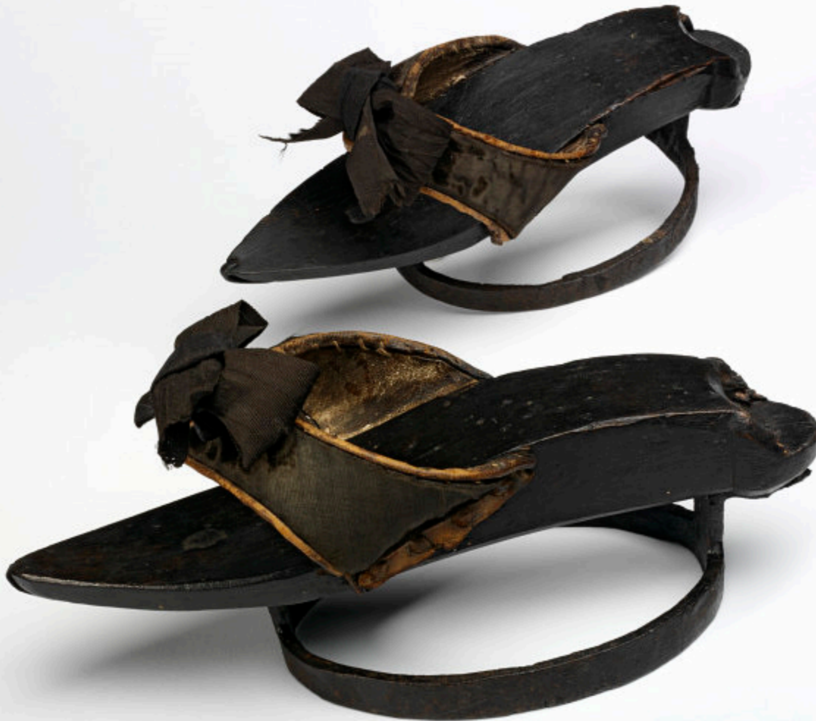
English Wood, Leather & Iron Ring Pattens c. 1720 - 1739 (Victoria & Albert Museum)