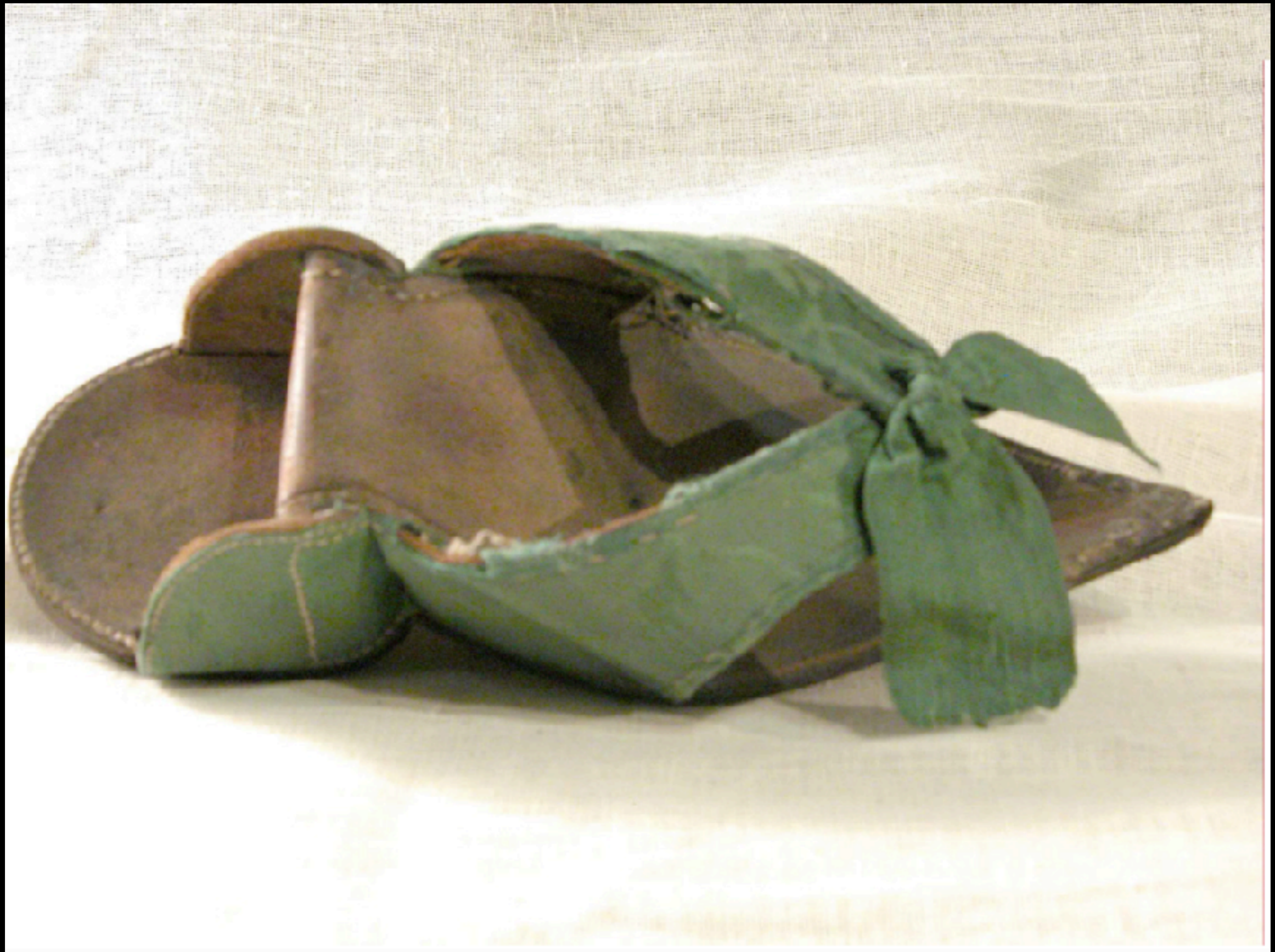
English Silk, Wool & Leather Clog c. 1720 (National Trust / Killerton, Devon)