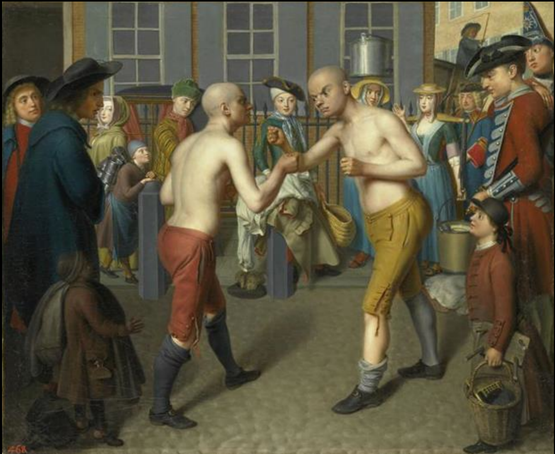
“Boxkampf in London” by Andreas Moller c. 1737 (Museum Kassel)