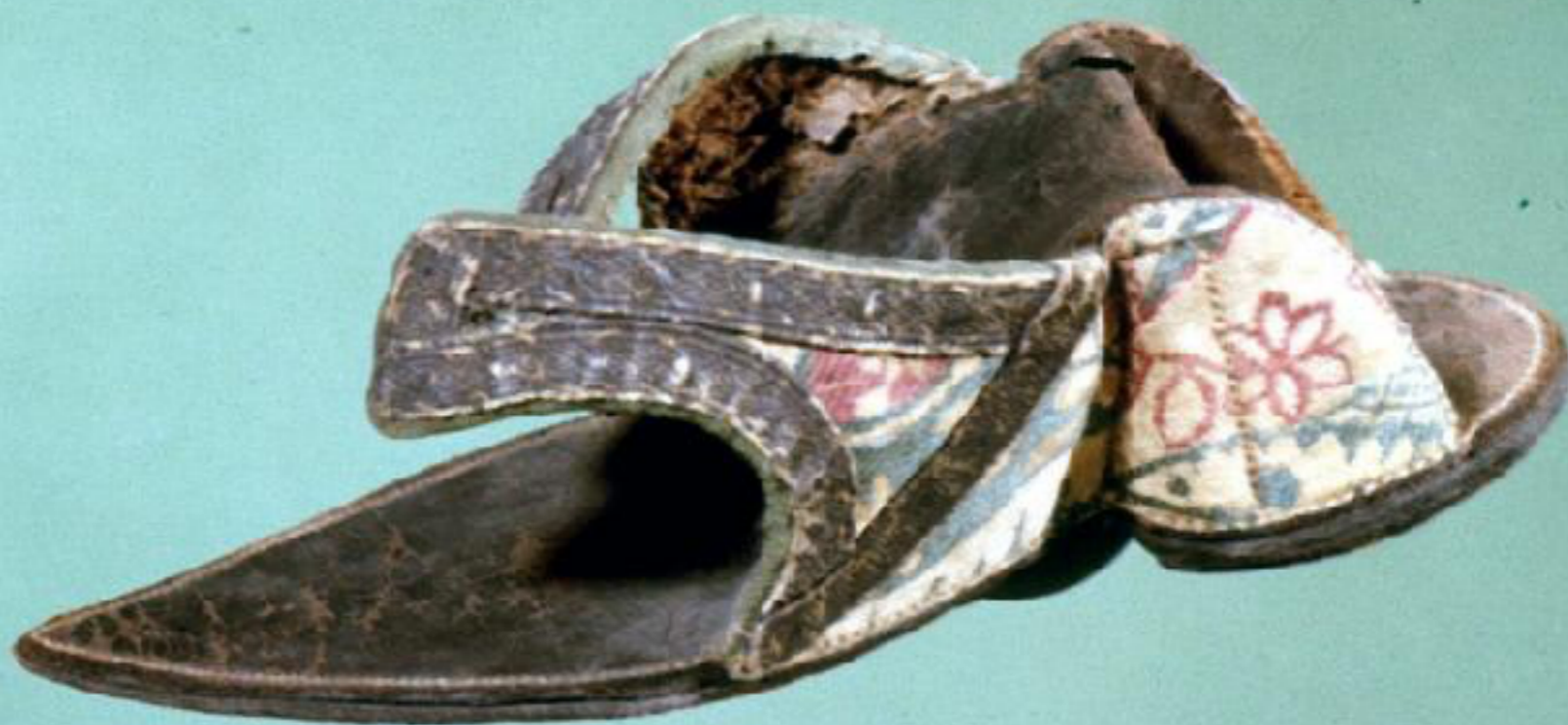
English Silk, Metallic Lace & Leather Clogs c. 1720 - 1765 (Colonial Williamsburg Foundation)