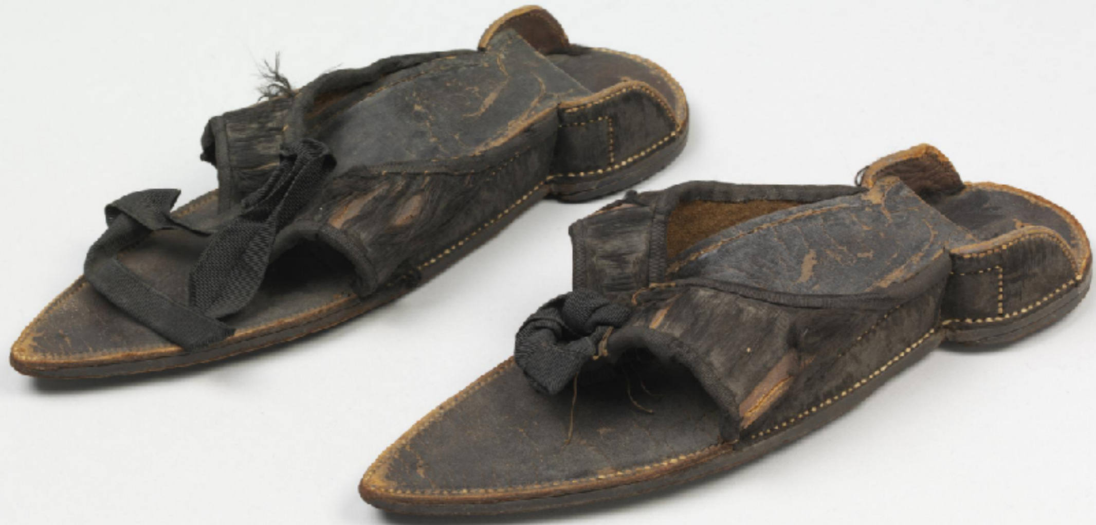
European Leather Clogs Early 18th Century (Victoria & Albert)