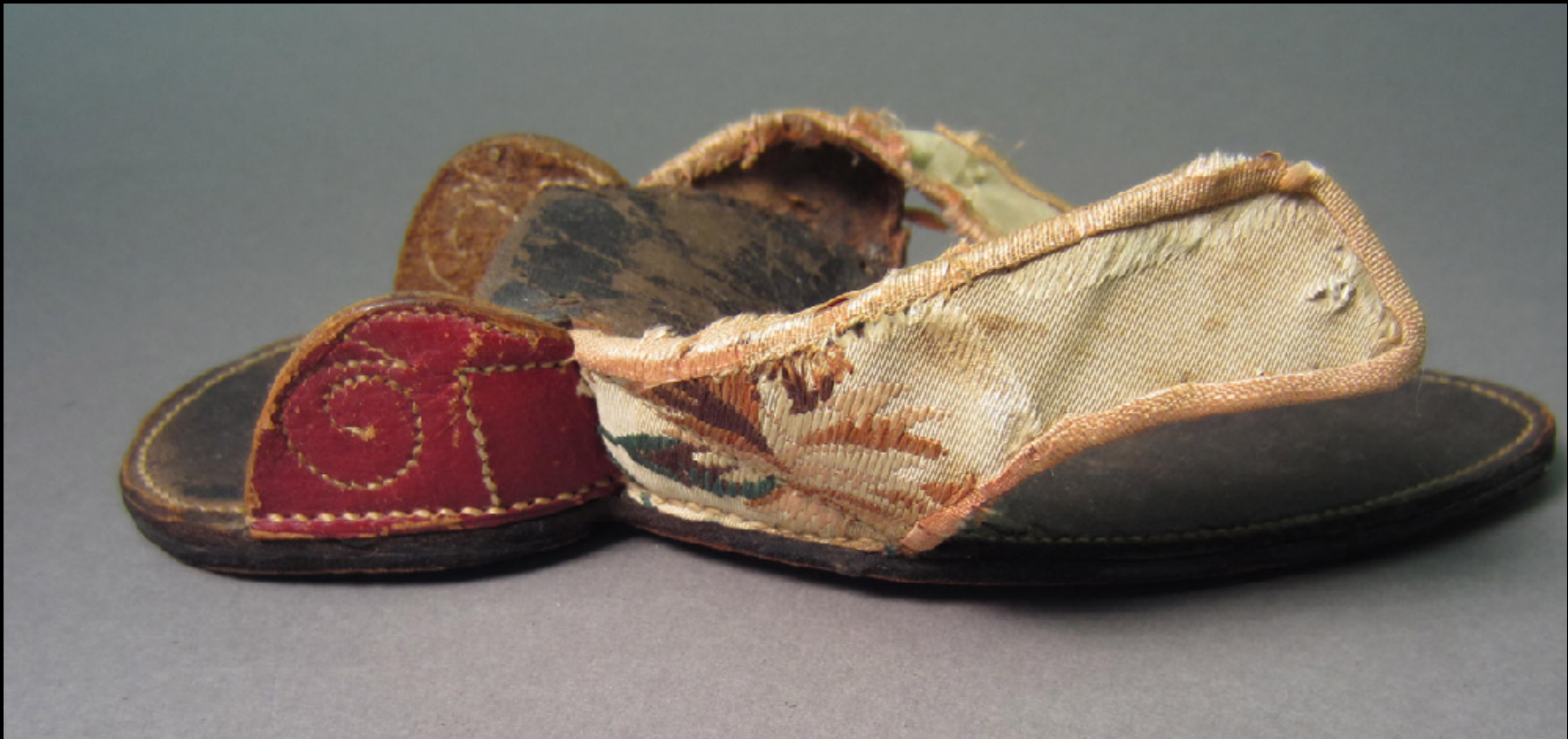
Silk & Leather Clog