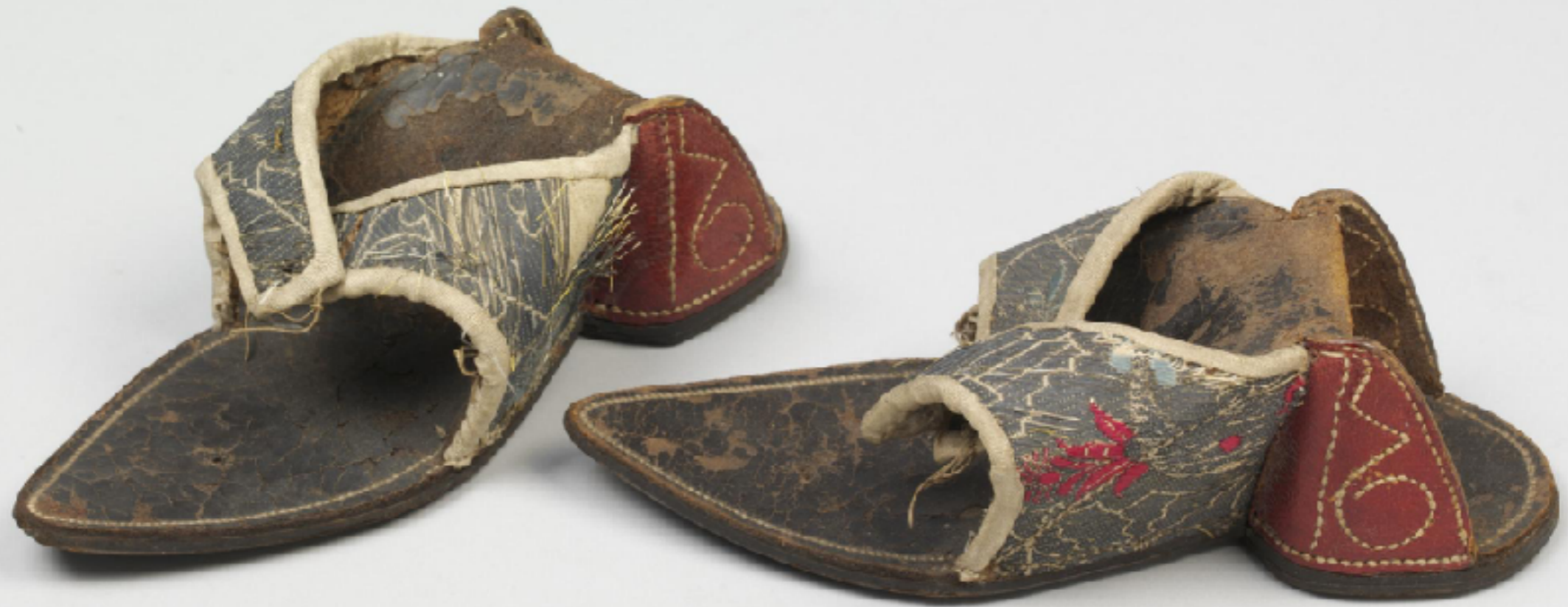
European Silk & Leather Clogs