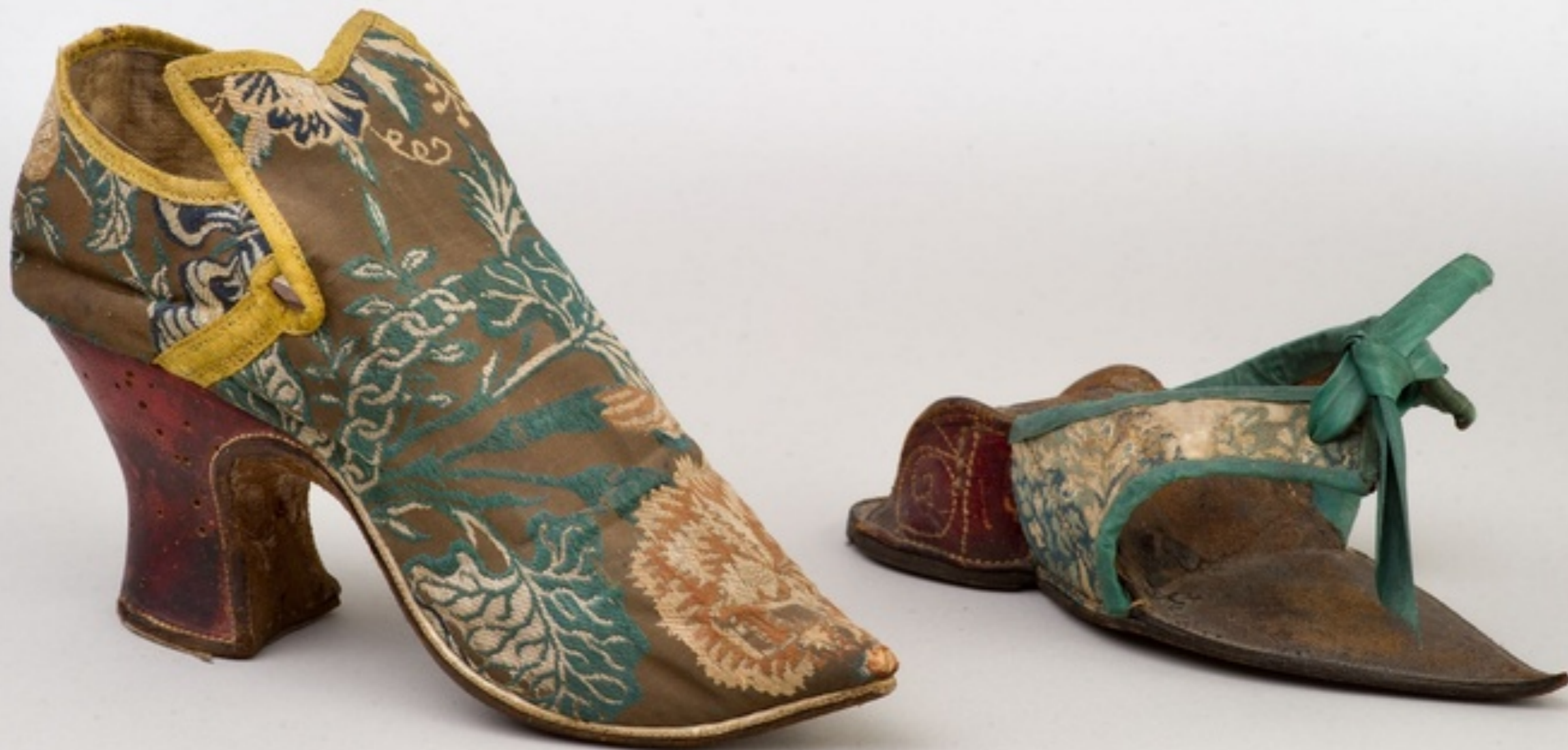
English Silk & Leather Clog with Matching Shoe Early 18th Century (Shelburne Museum)