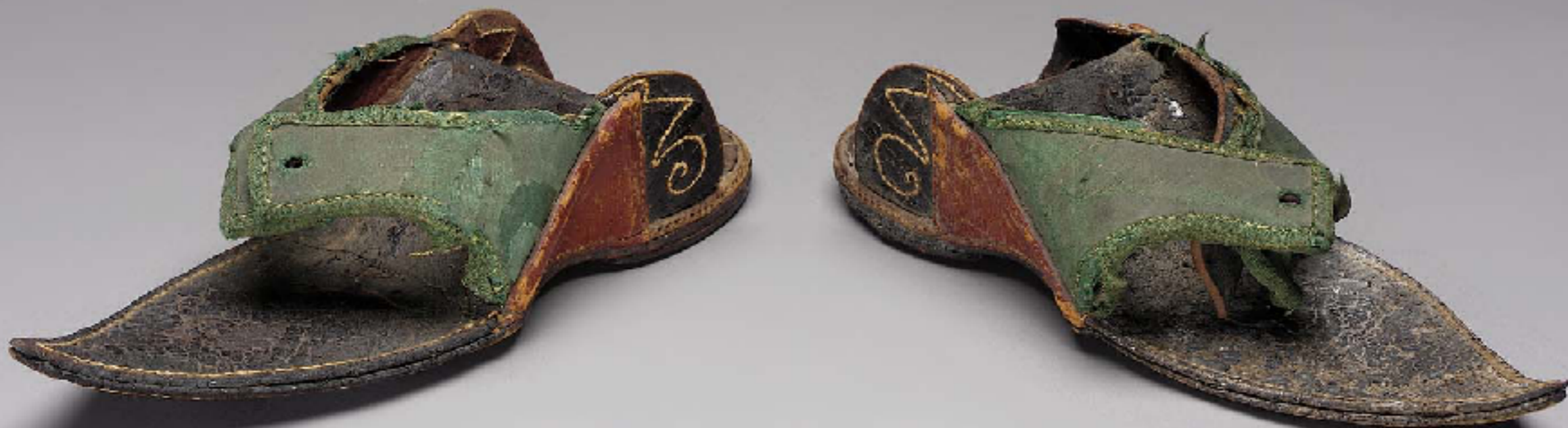
European Silk & Leather Clogs Early - Mid 18th Century (Museum of Fine Arts, Boston)