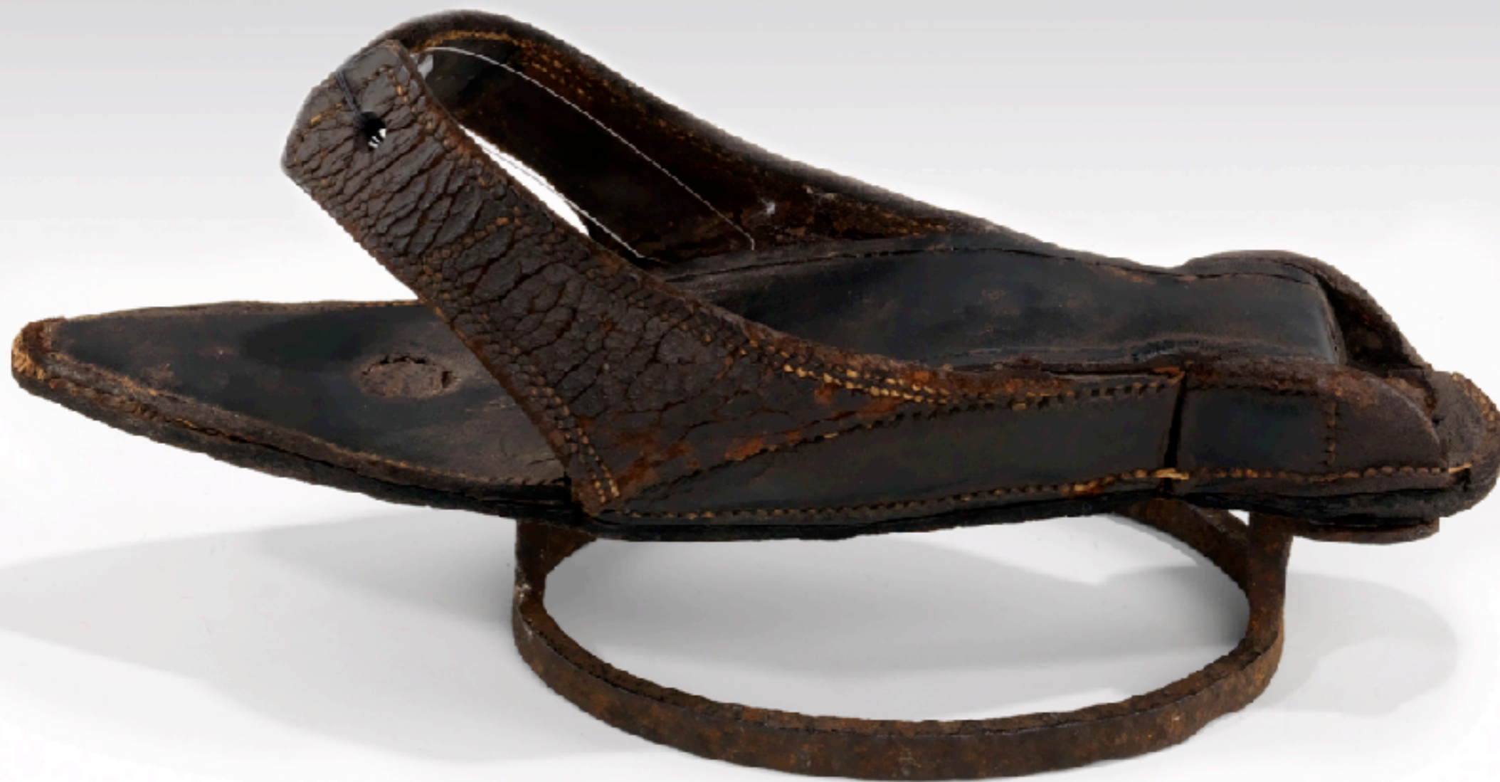
European Wood, Leather & Iron Ring Patten 18th Century (Metropolitan Museum of Art)