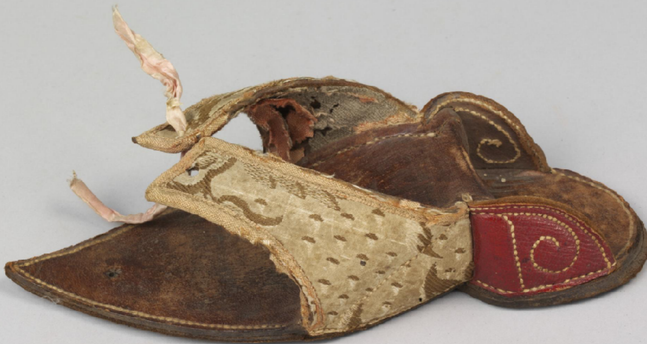
European Silk & Leather Clog