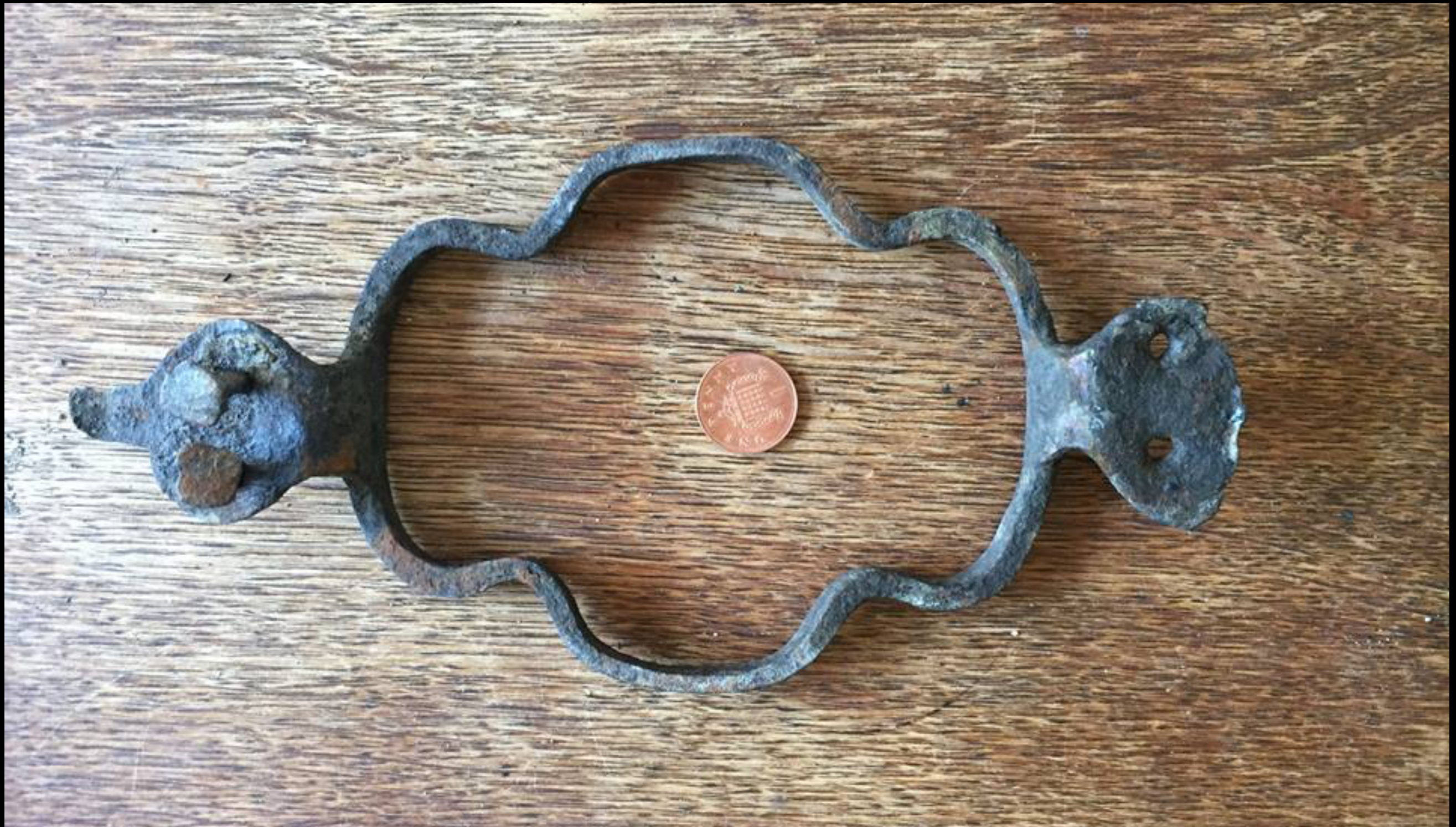
English Iron Ring from a Patten Found on the Thames Foreshore 18th Century