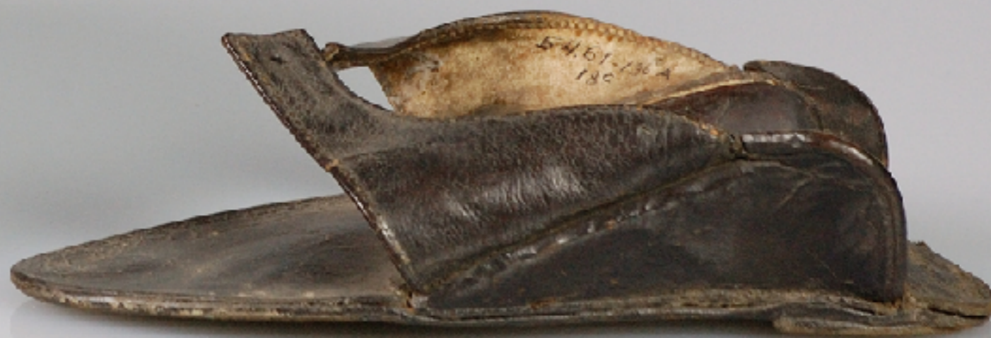
European Leather Clog c. 1750 - 1789 (Metropolitan Museum of Art)