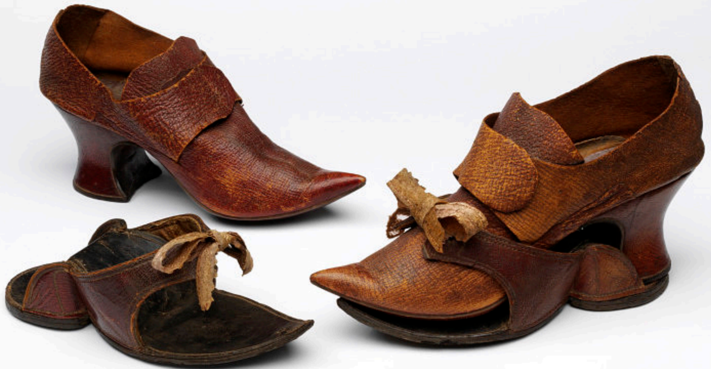
English Leather Clogs c. 1700 (Victoria & Albert)