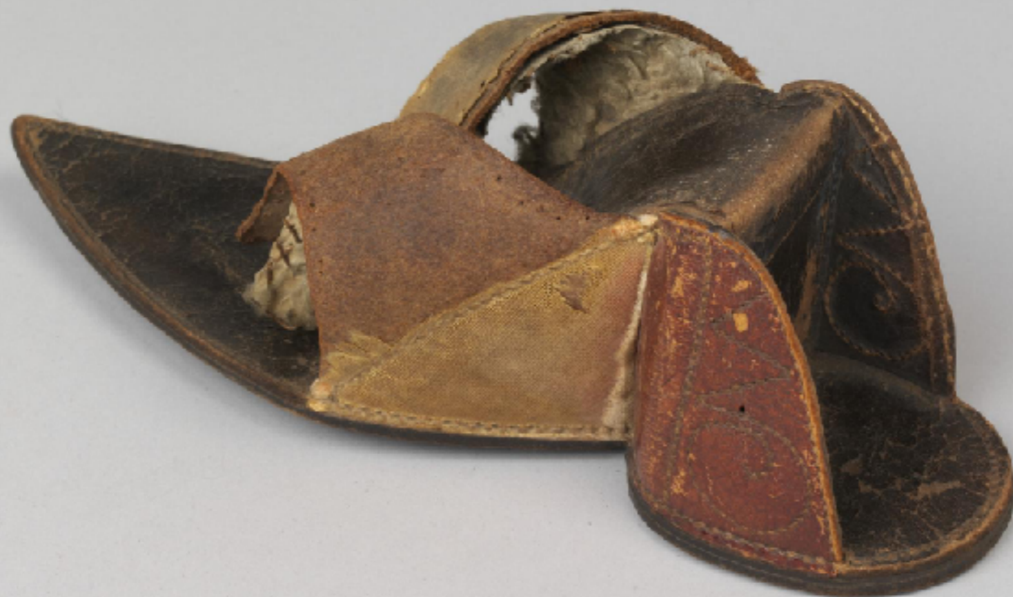
English Leather Clog 18th Century (Victoria & Albert)