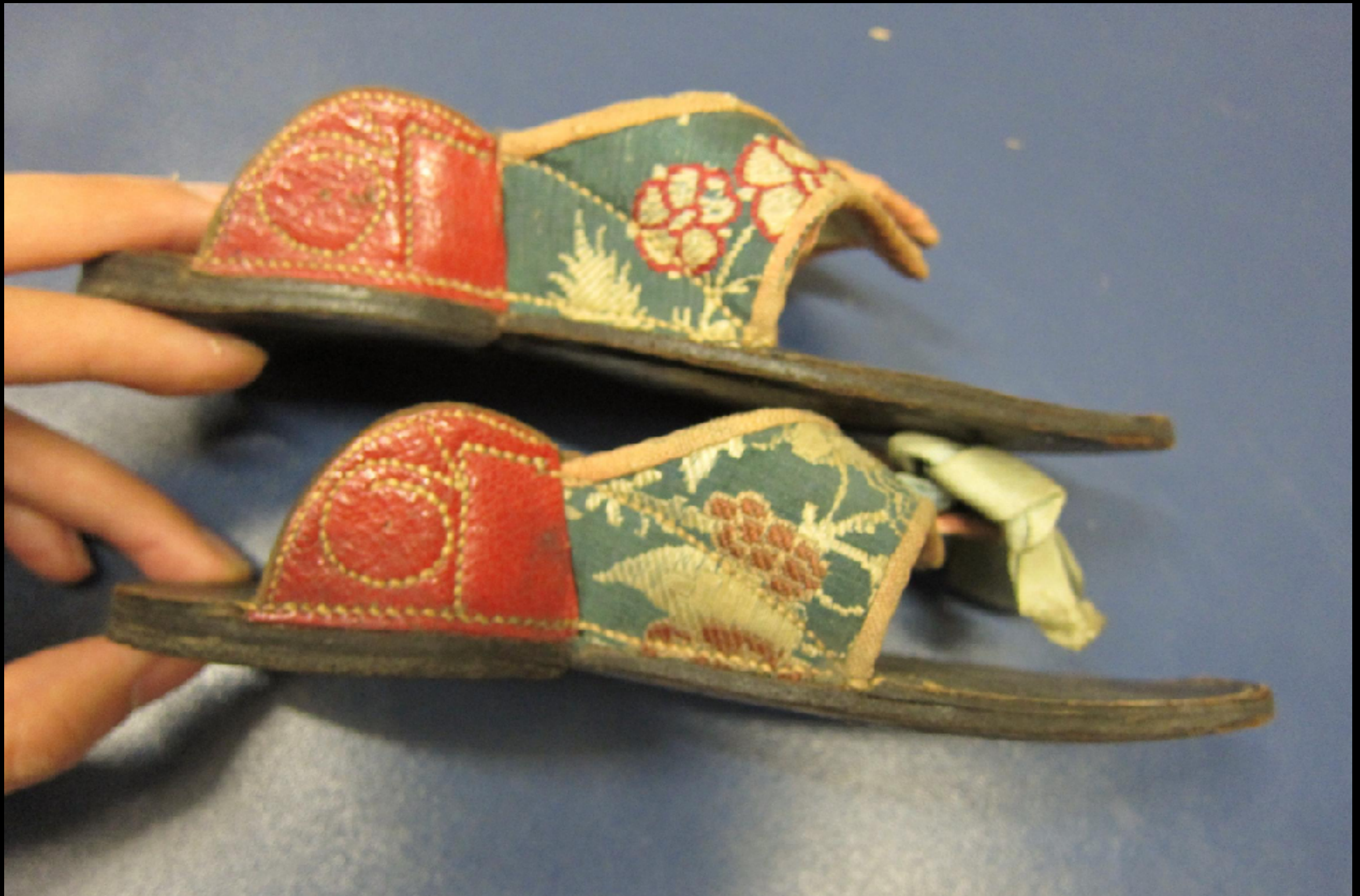
European Silk & Leather Clogs