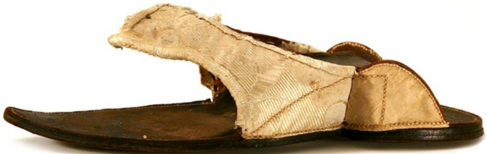
English Silk Brocade & Leather Clog