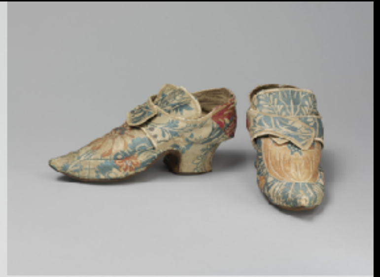
European Silk & Leather Clogs with Matching Shoes