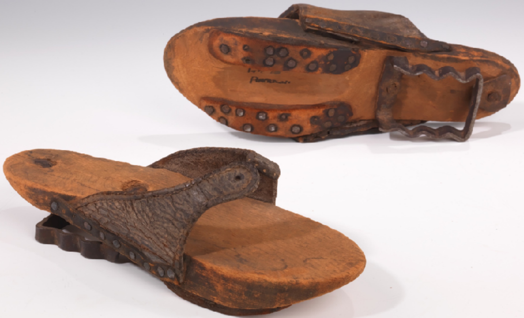
American Wood, Leather, & Iron Ring Patters 18th Century (Metropolitan Museum of Art)