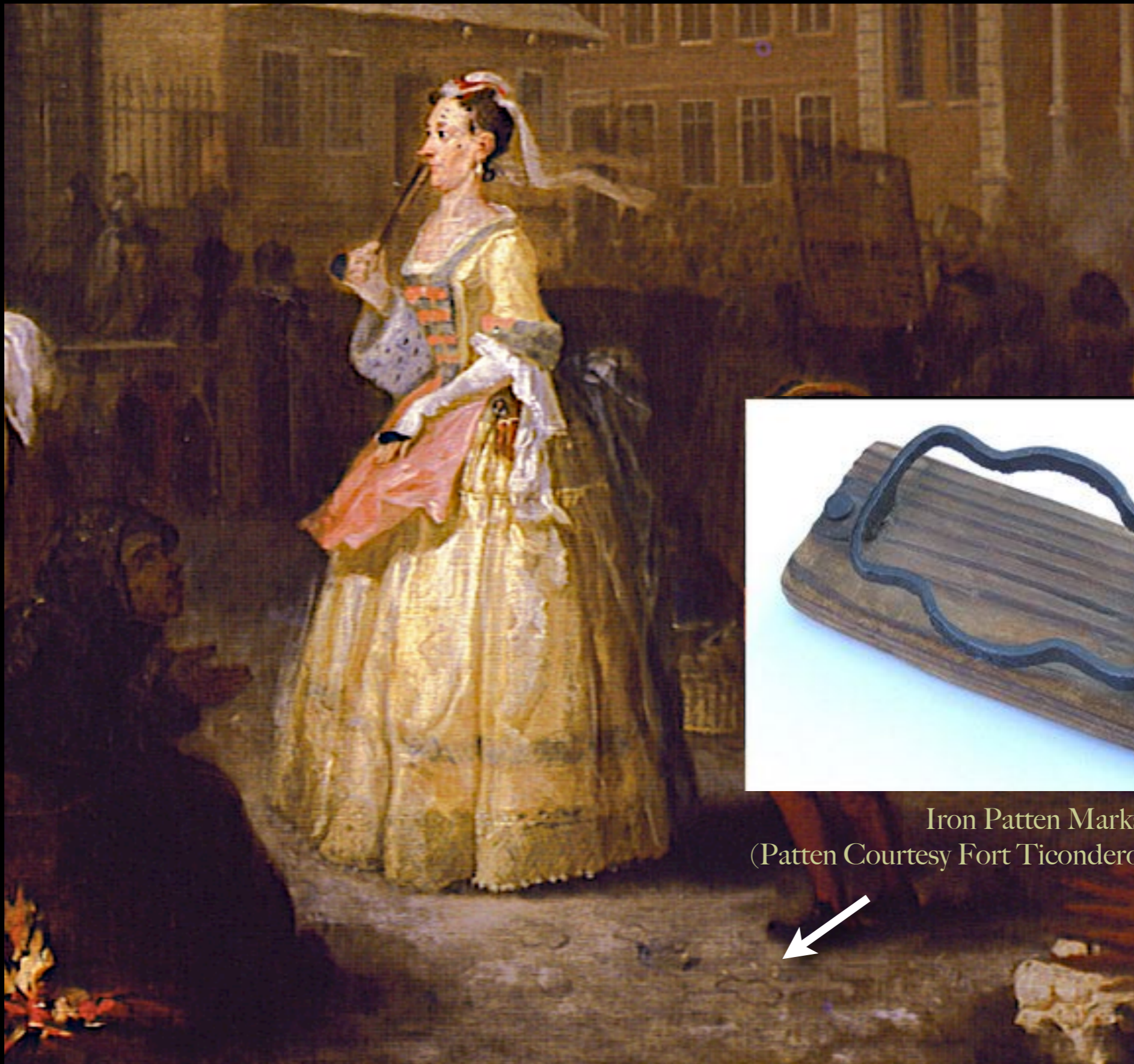
Iron Patten Marks