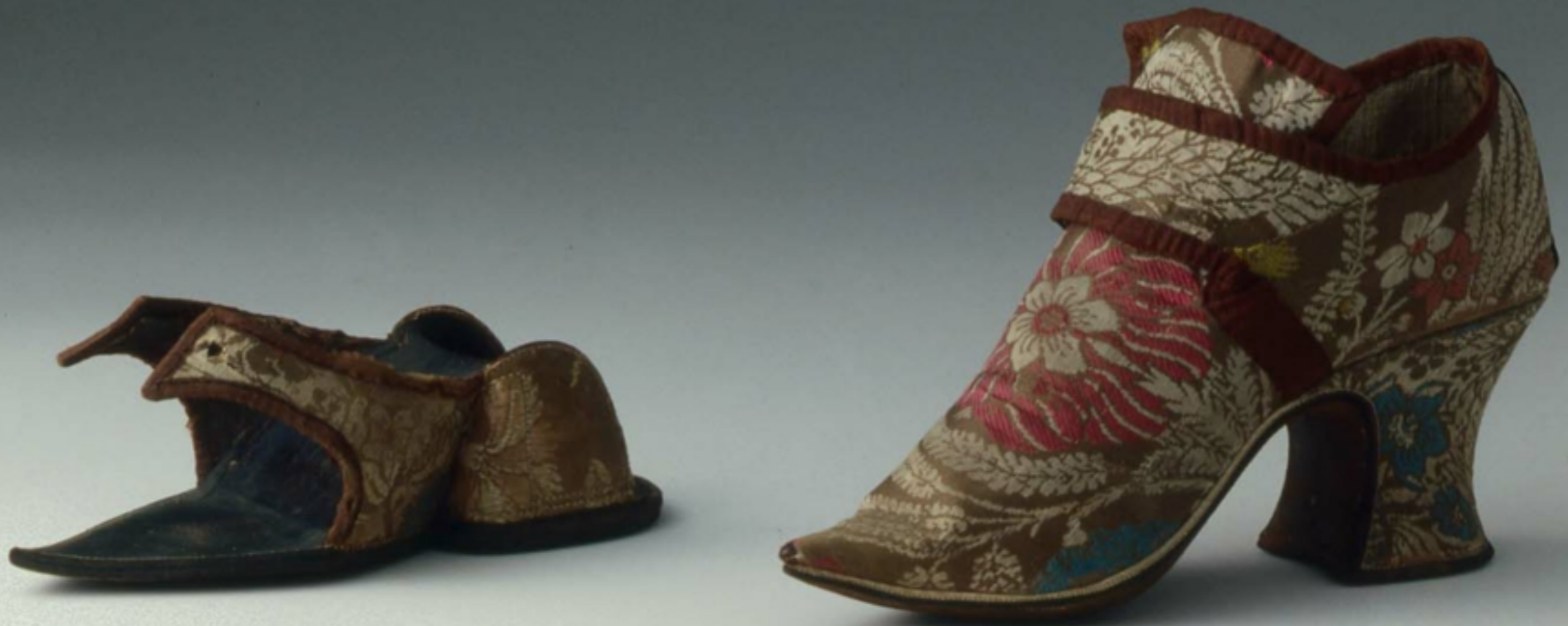
French Silk & Leather Clog with Matching Shoe Early - Mid 18th Century (Museum of Fine Arts, Boston)