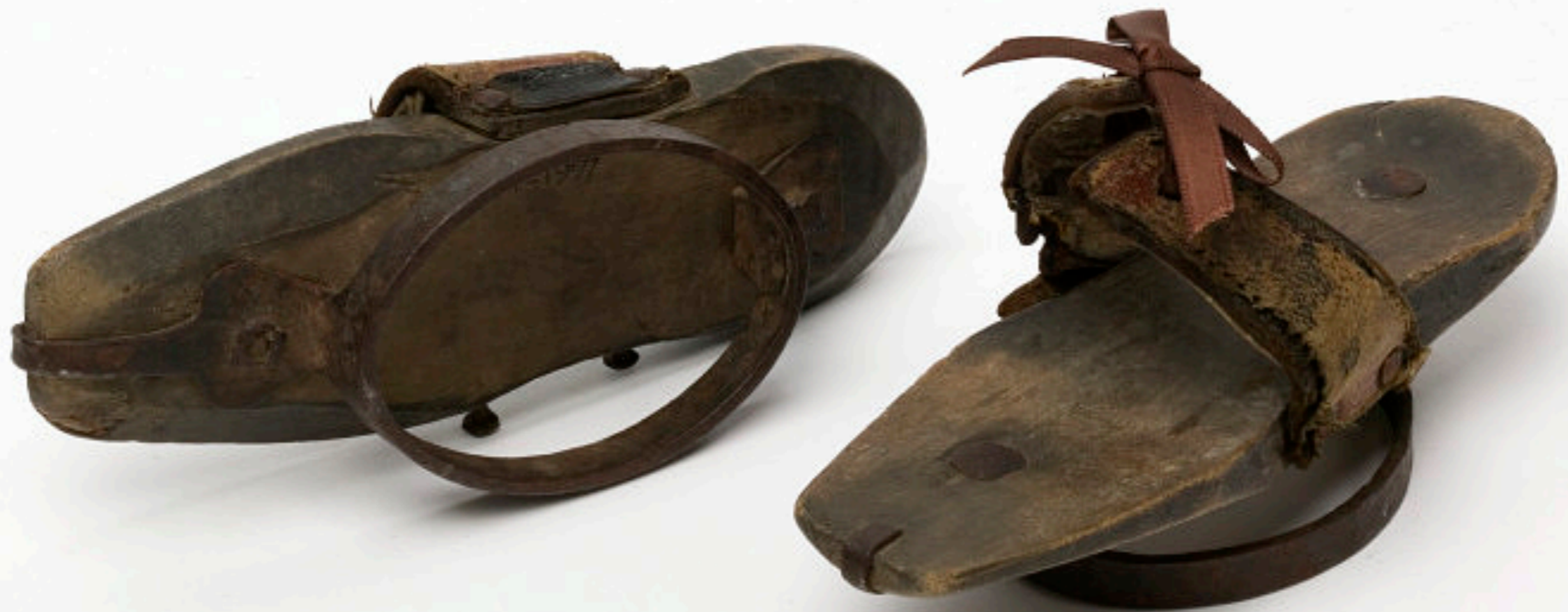
English Wood, Leather, & Iron Ring Pattens c. 1780 - 1800 (Victoria & Albert Museum)