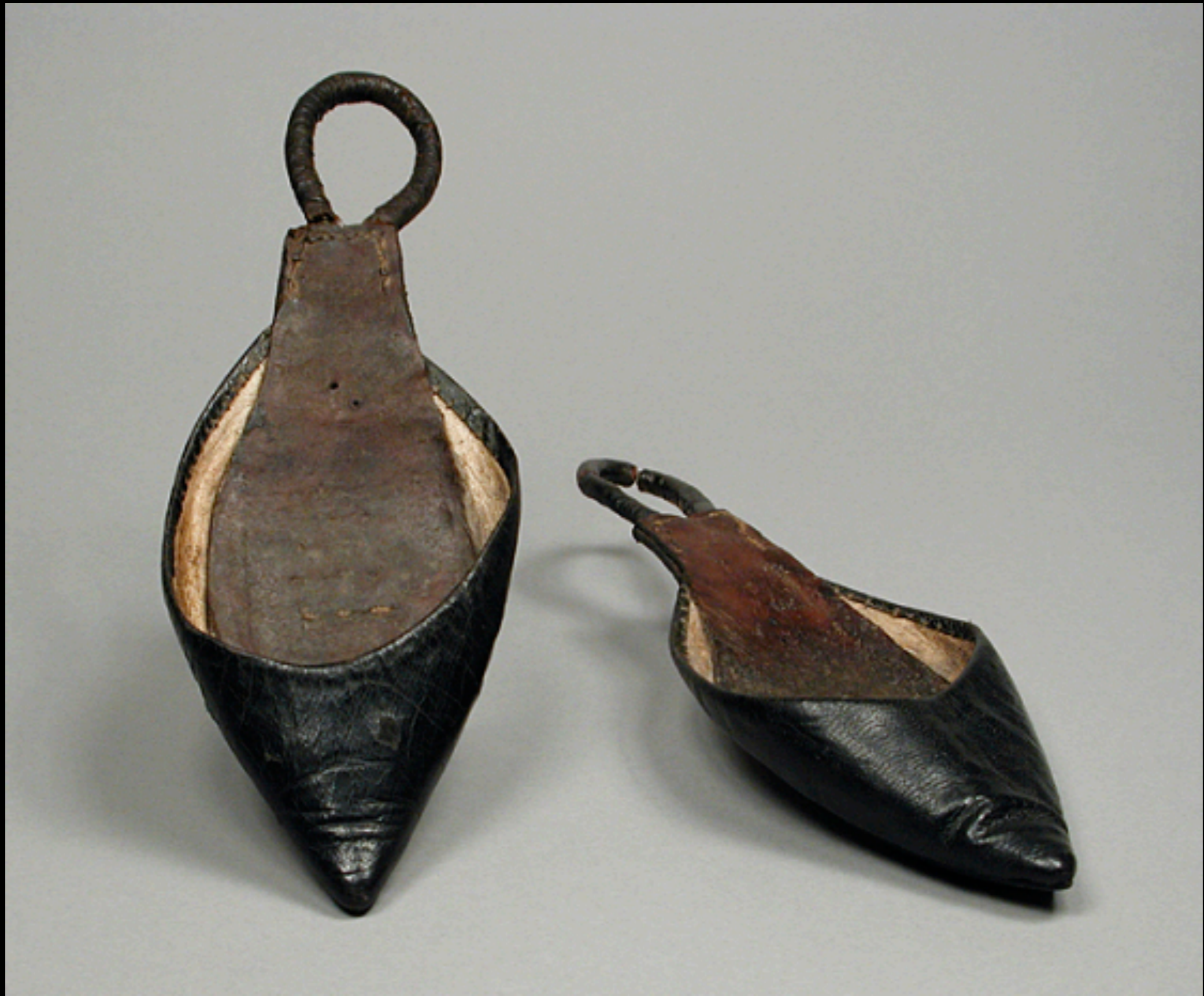
English or American Leather Clogs c. 1785 - 1795 (Los Angeles County Museum of Art)