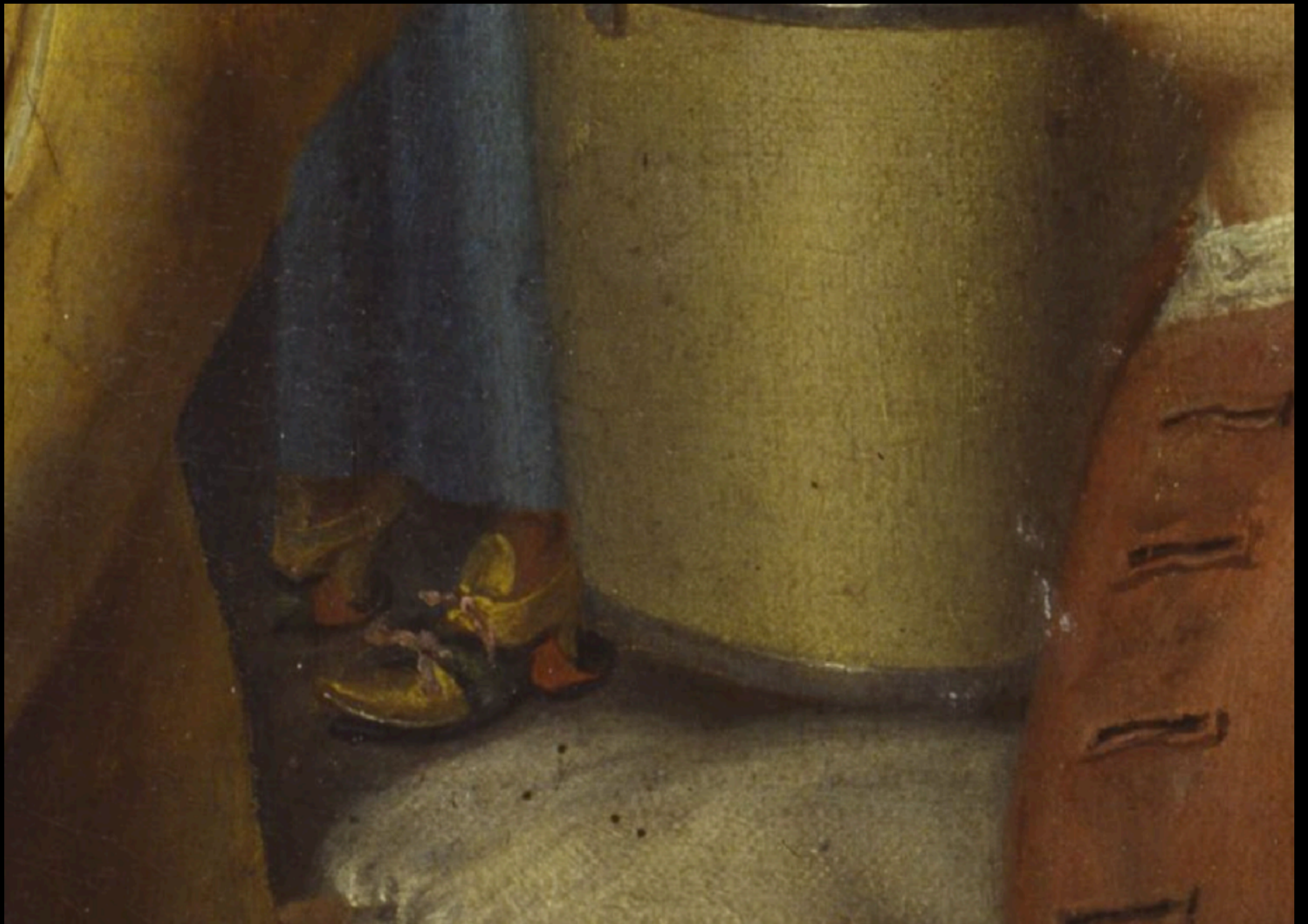
Clog Detail: "Boxkampf in London" by Andreas Moller c. 1737 (Museum Kassel)