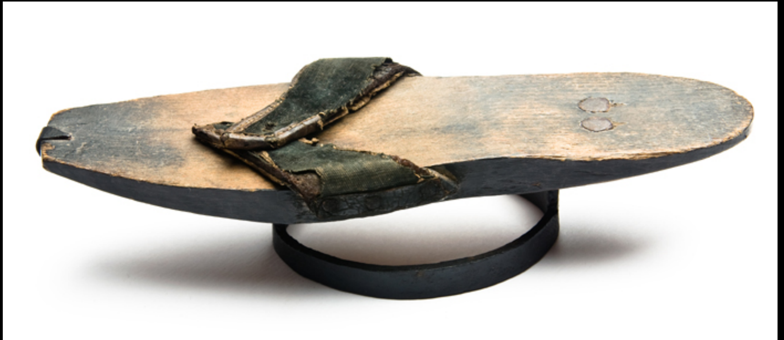
English Wood, Leather, & Iron Ring Patten Mid to Late 18th Century (Charlestown Museum)