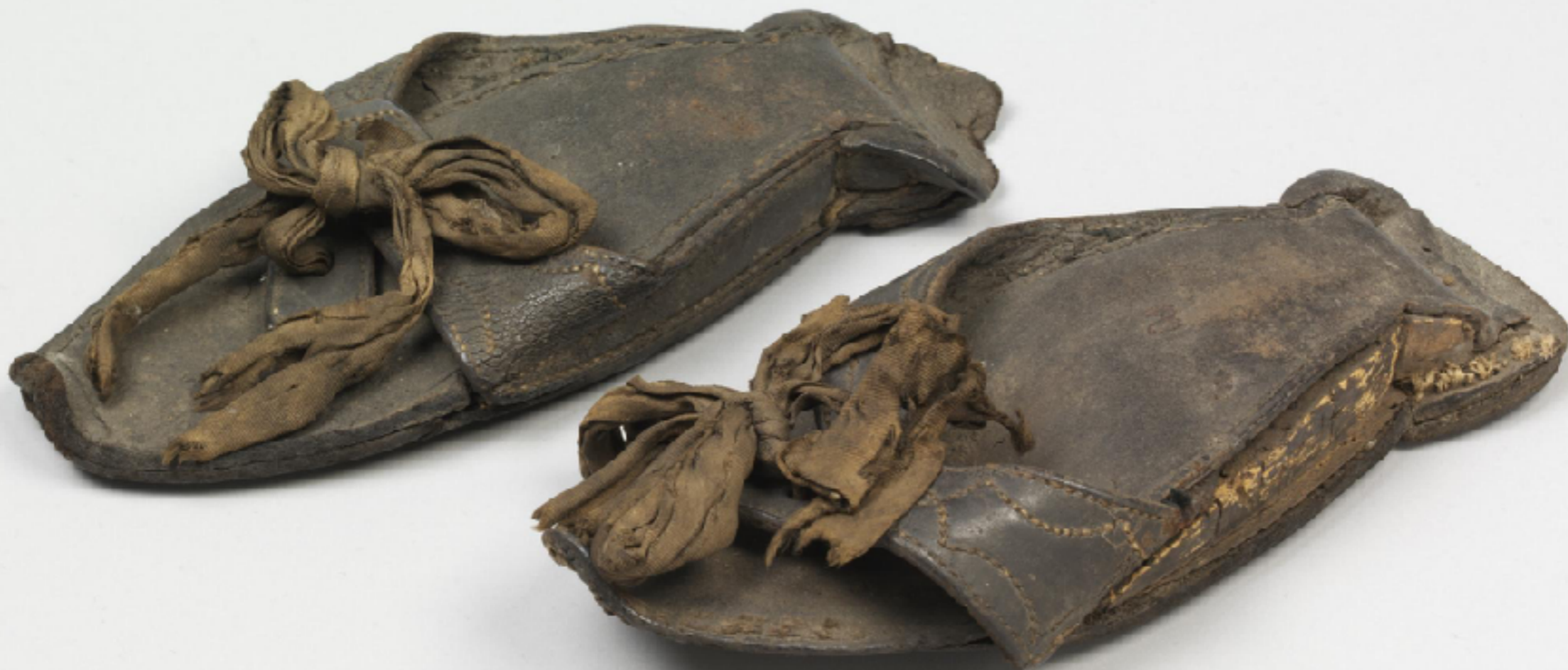
English Leather Clog 18th Century