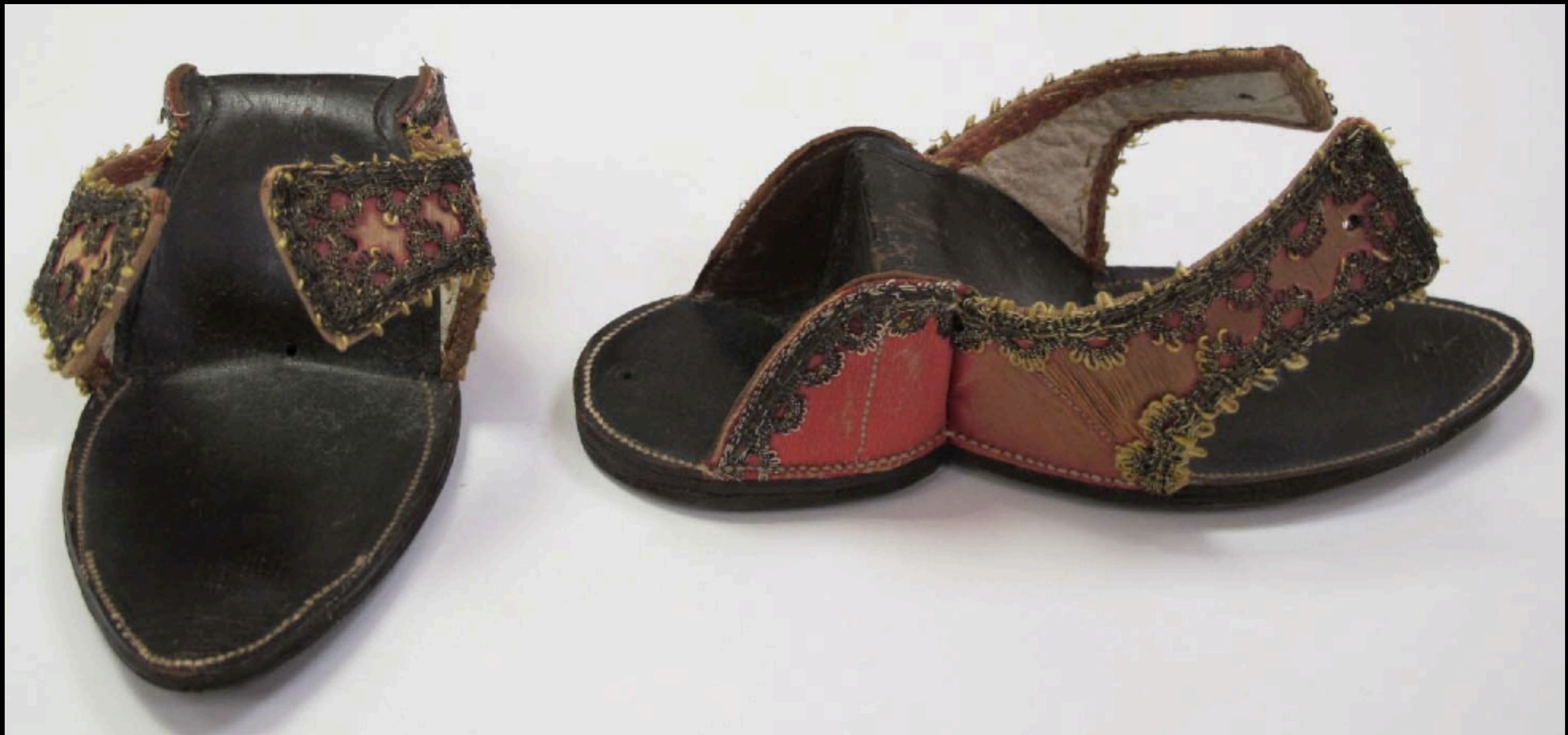
European Silk & Leather Clog Early 18th Century (Metropolitan Museum of Art)