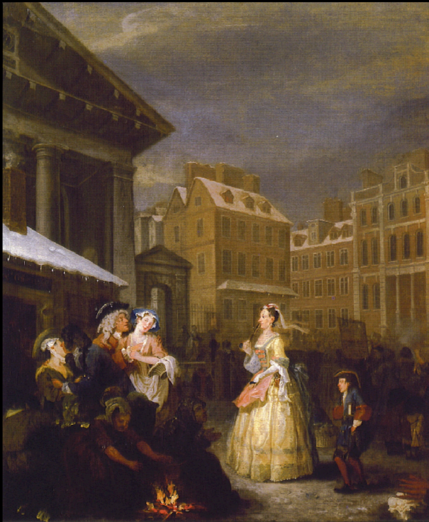
“The Four Times of Day: Morning” by William Hogarth 1736 (Upton House, Oxfordshire)