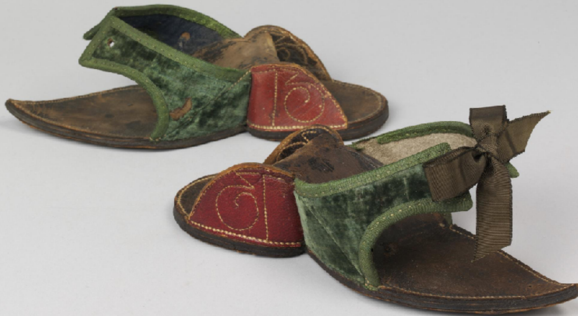
English Clogs c. 1730 (Victoria & Albert)