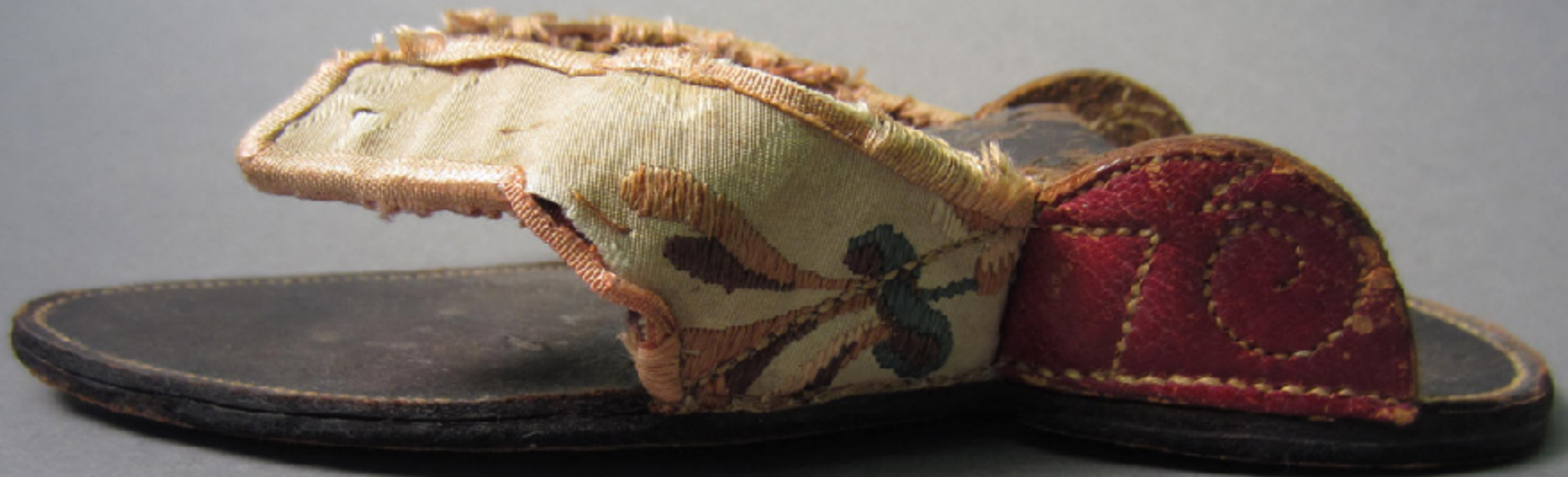
Silk & Leather Clog