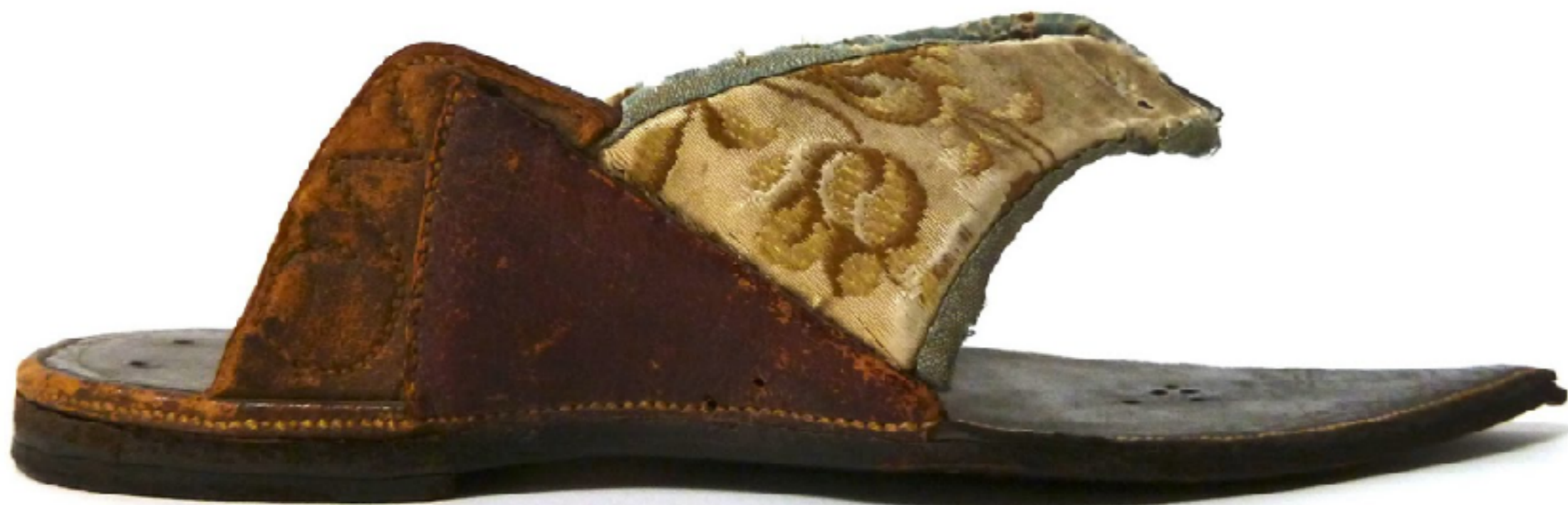
English Silk Brocade & Leather Clog