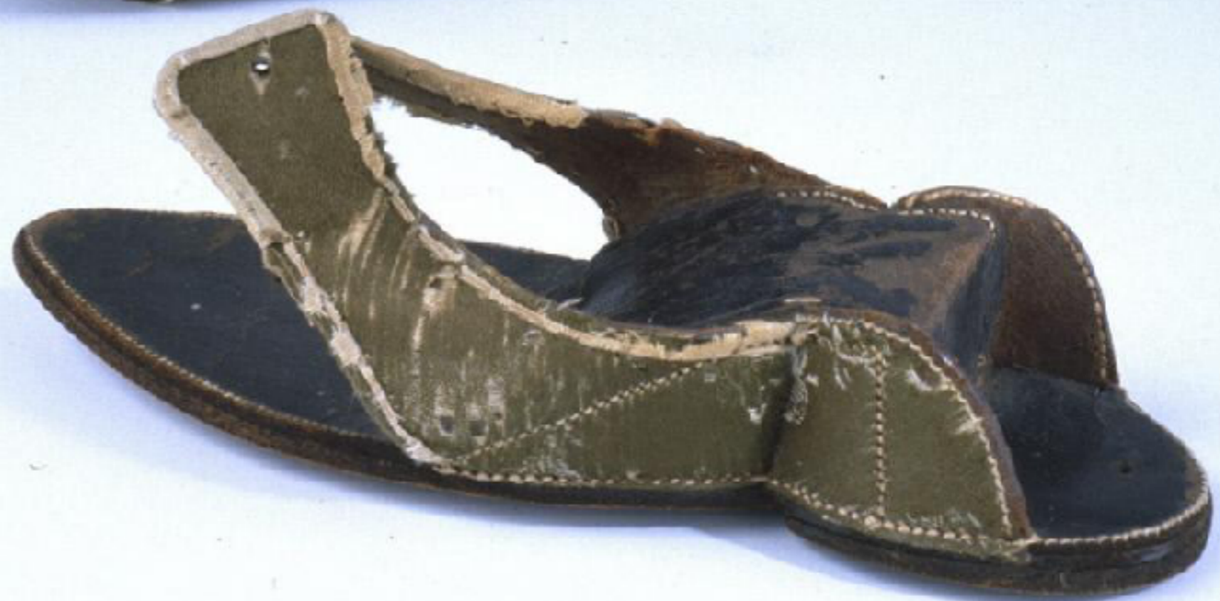
English Silk & Leather Clogs c. 1730 - 1750 (Colonial Williamsburg Foundation)