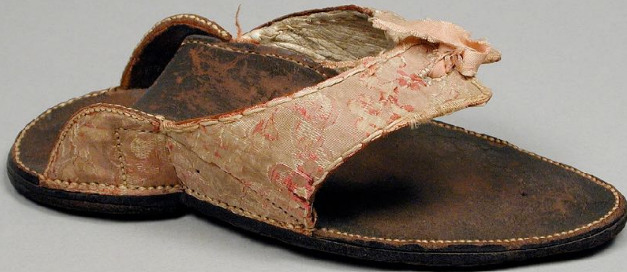
English Silk & Leather Clog c. 1750 (Los Angeles County Museum of Art)