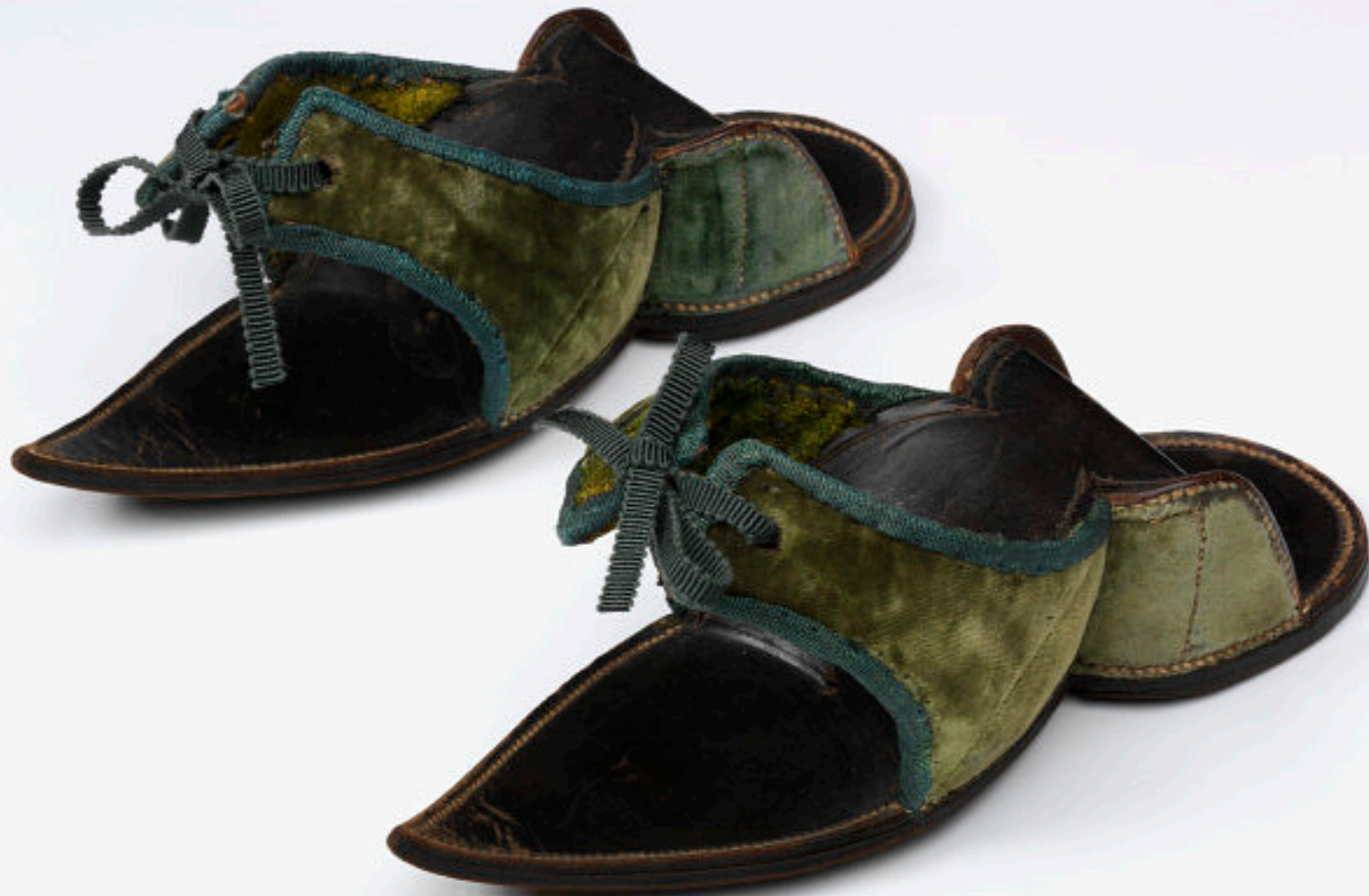
English Green Velvet & Leather Clogs