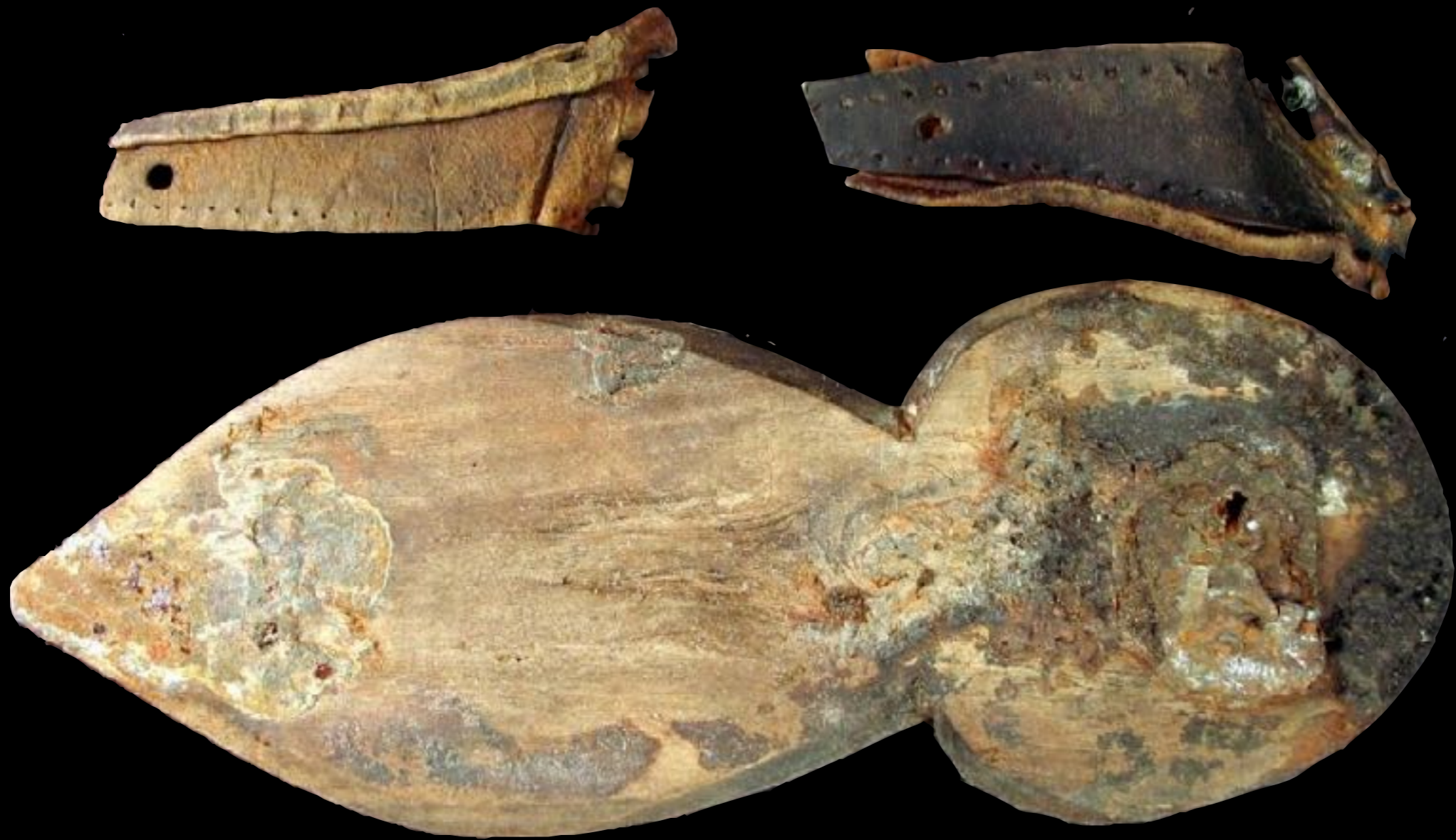
Wood, Leather & Iron (?) Patten from the H.M.S. Invincible, Chatham Dockyard c. 1758