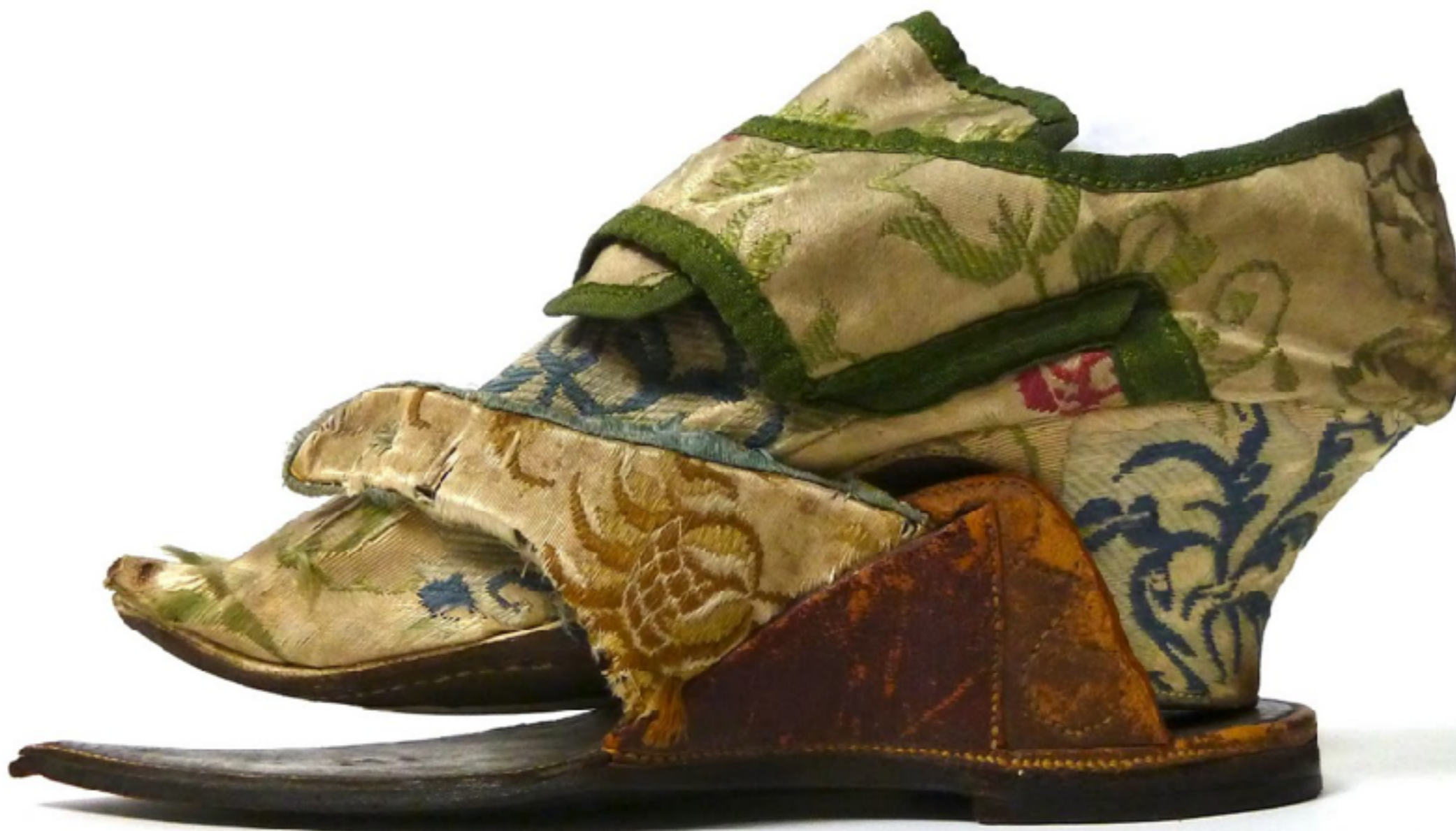
English Silk Brocade & Leather Clog with Matching Shoe