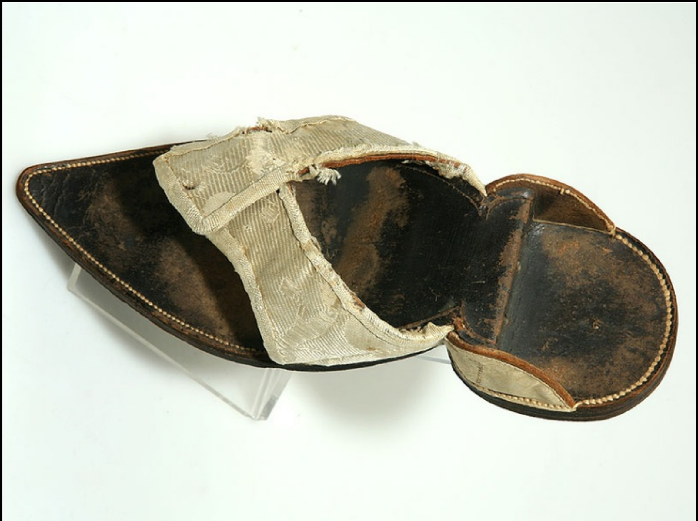
English Silk Brocade & Leather Clog