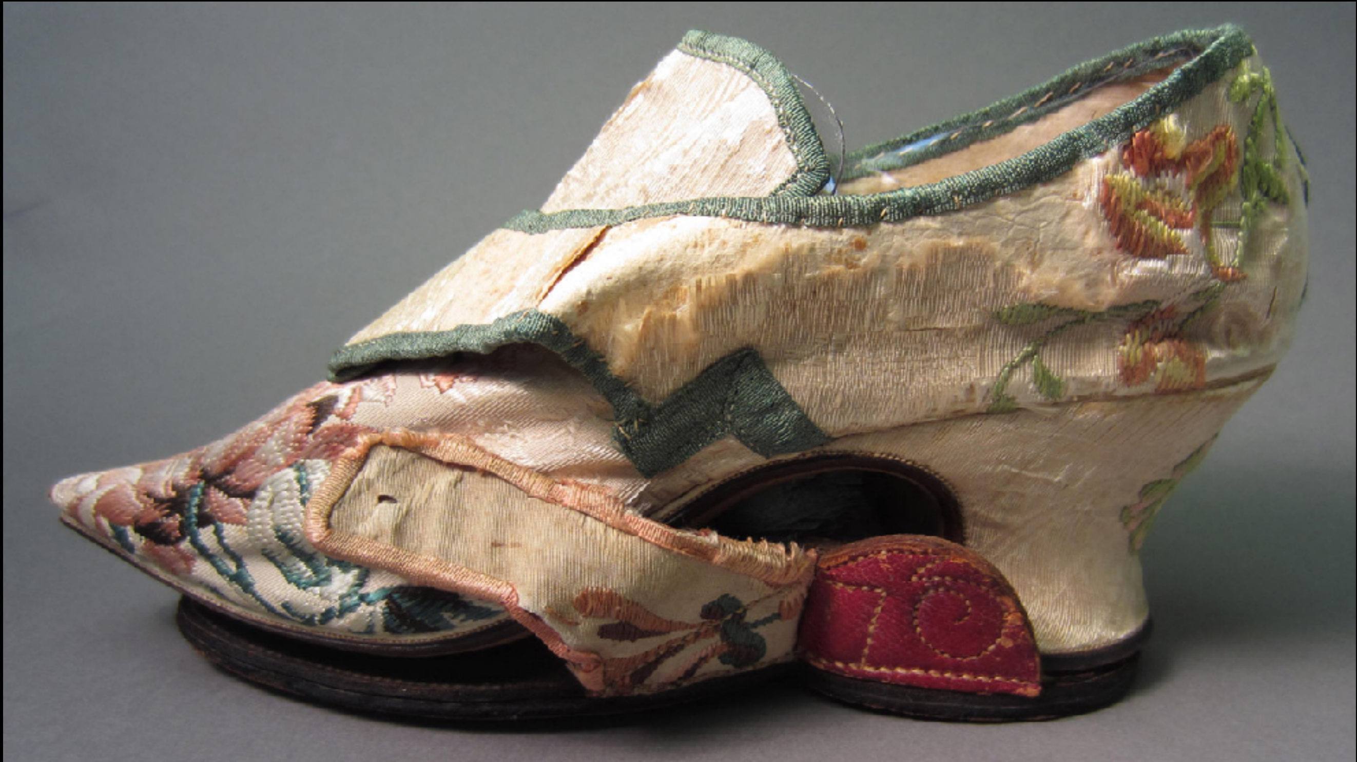
Silk & Leather Clog with Matching Shoe