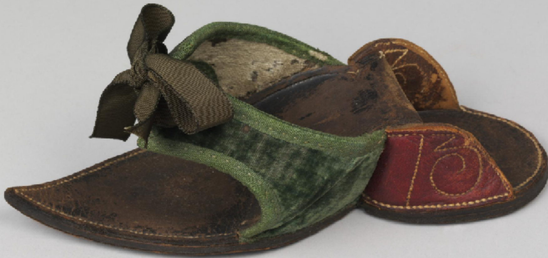
English Clog c. 1730 (Victoria & Albert)