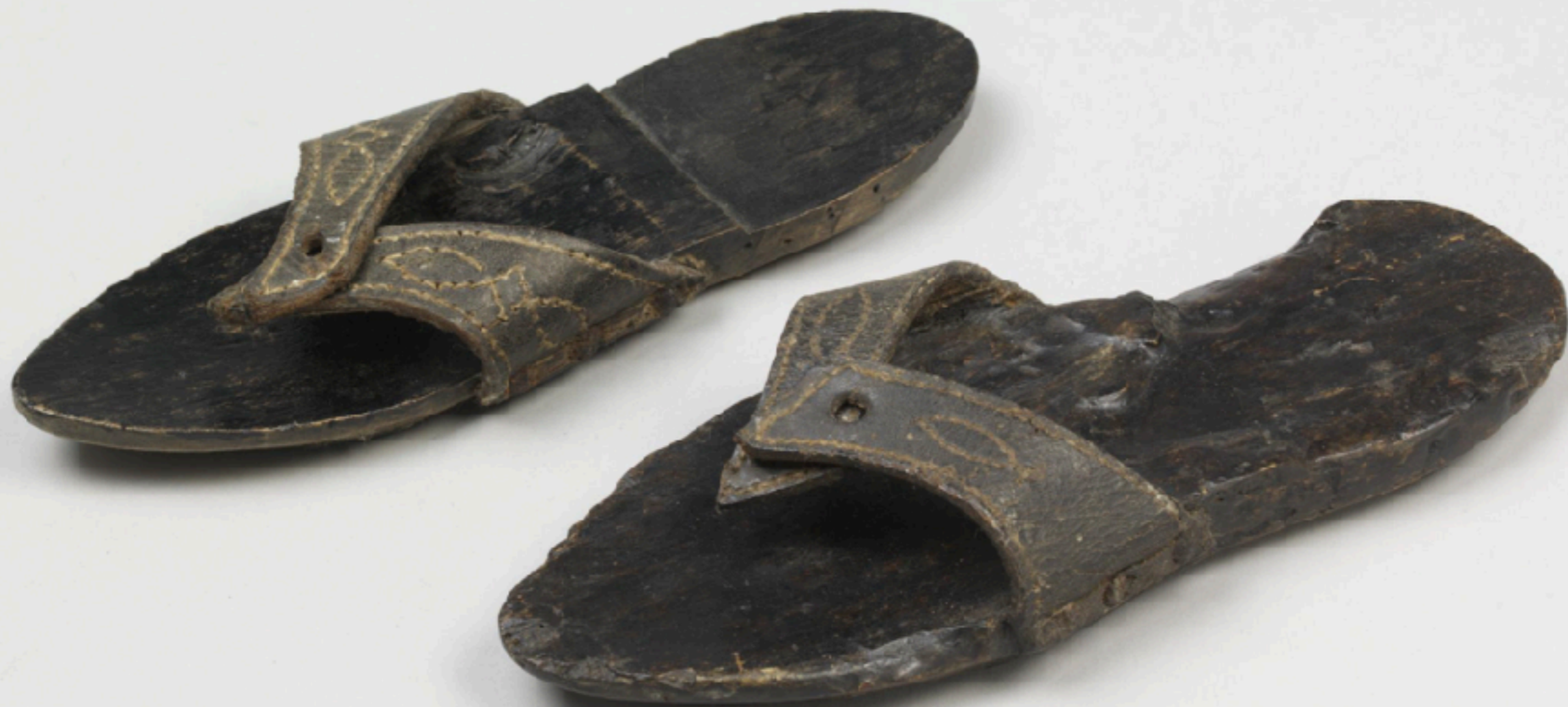
European Leather Clogs c. 1780 (Victoria & Albert)