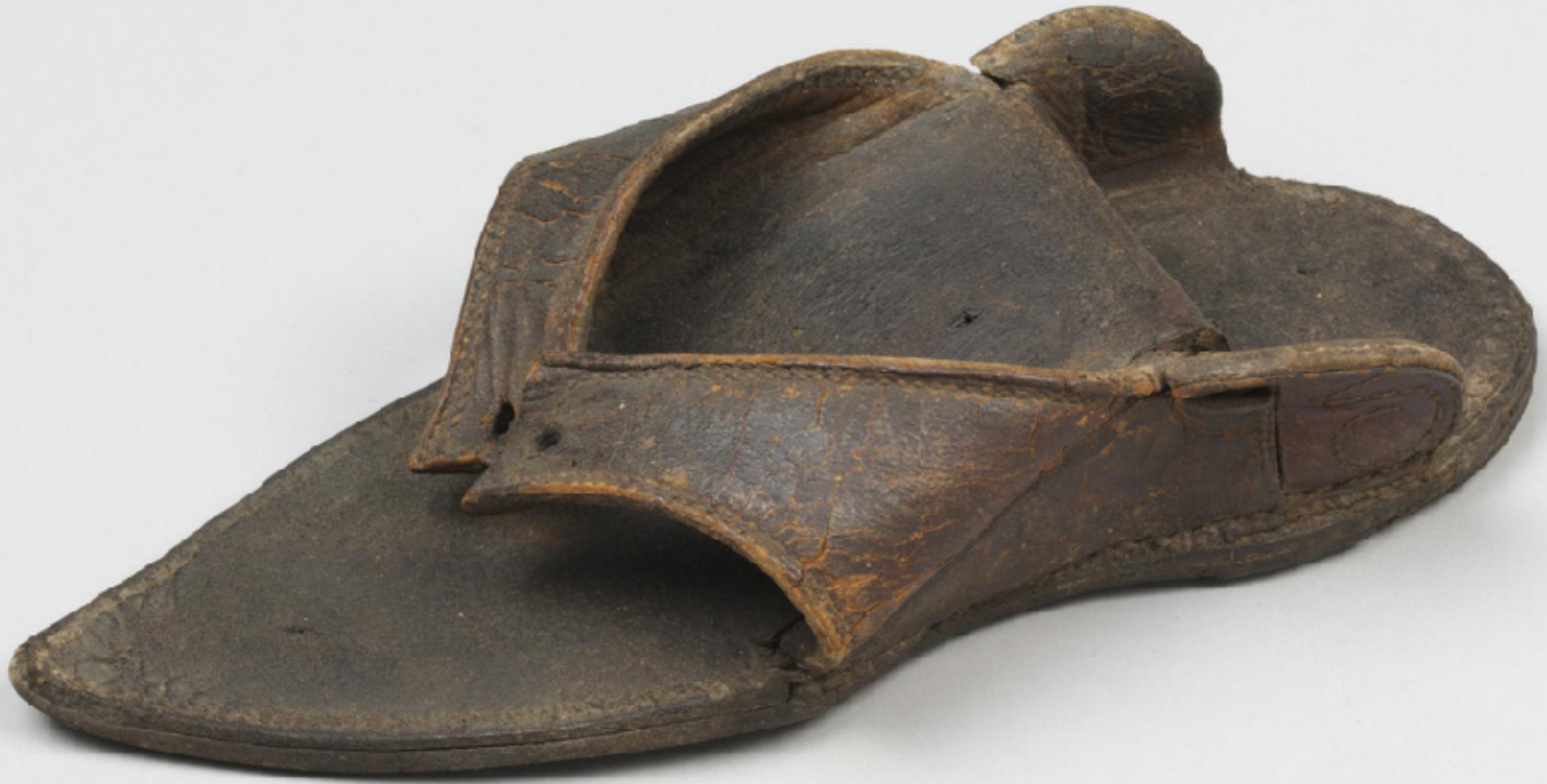
English Leather Clog c. 1700 - 1750 (Victoria & Albert)