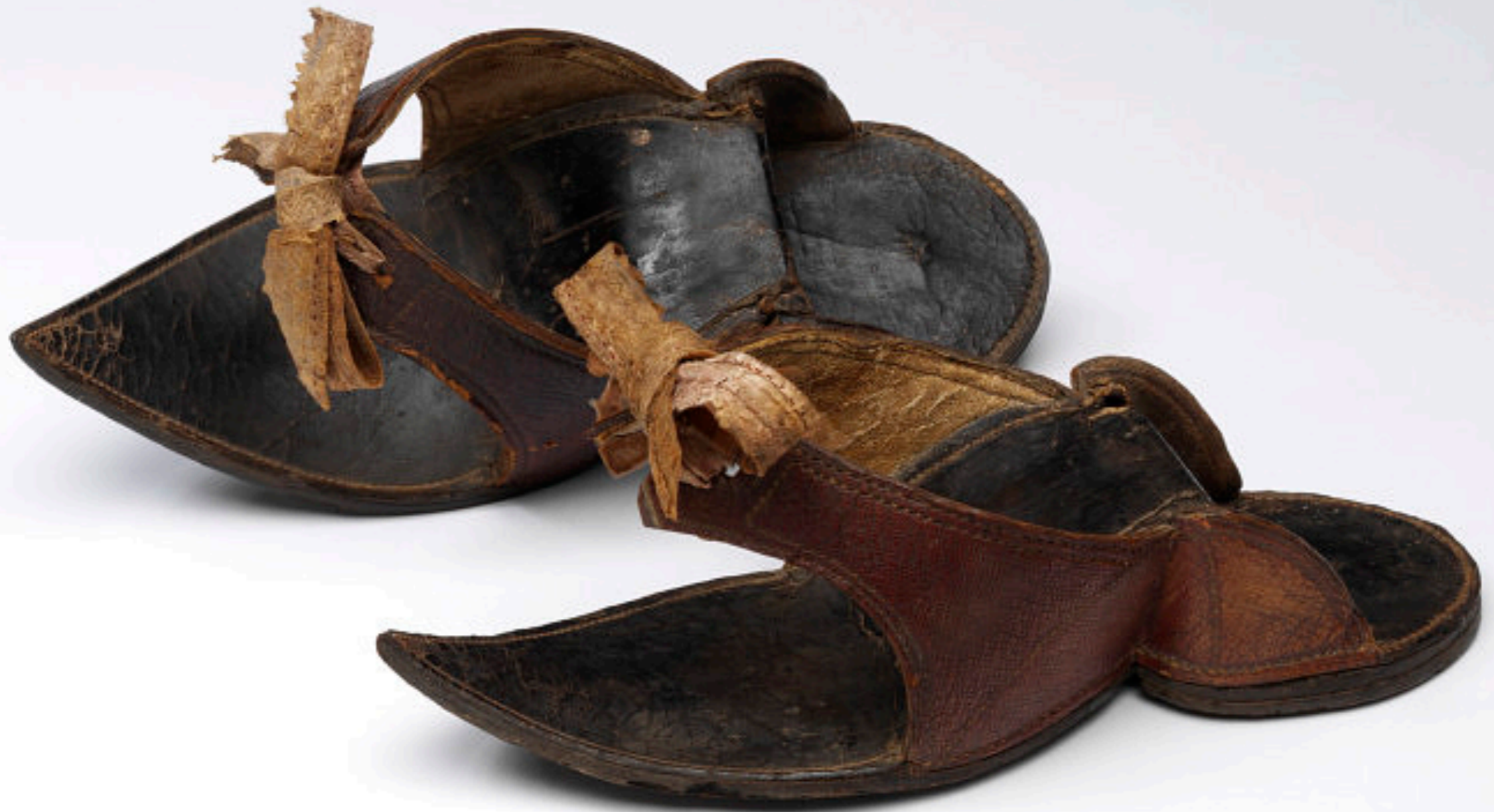
English Leather Clogs c. 1700 - 1750 (Victoria & Albert)