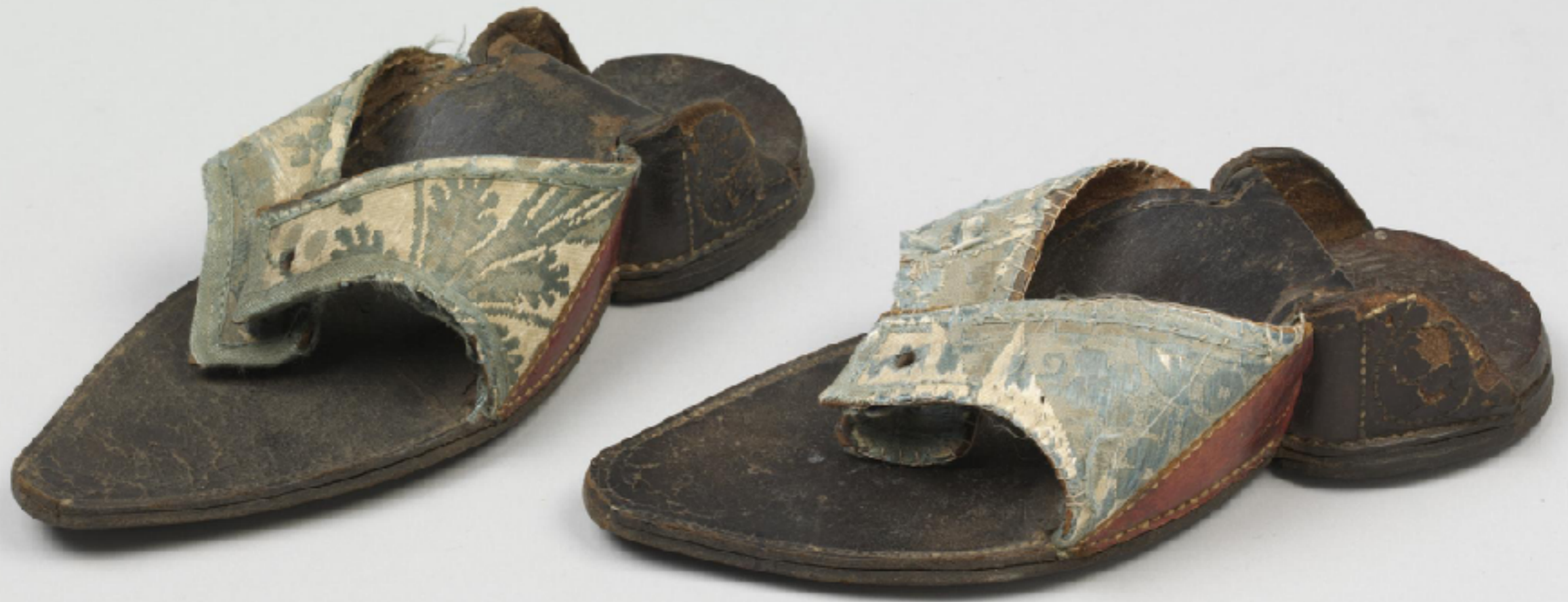
European Silk & Leather Clogs