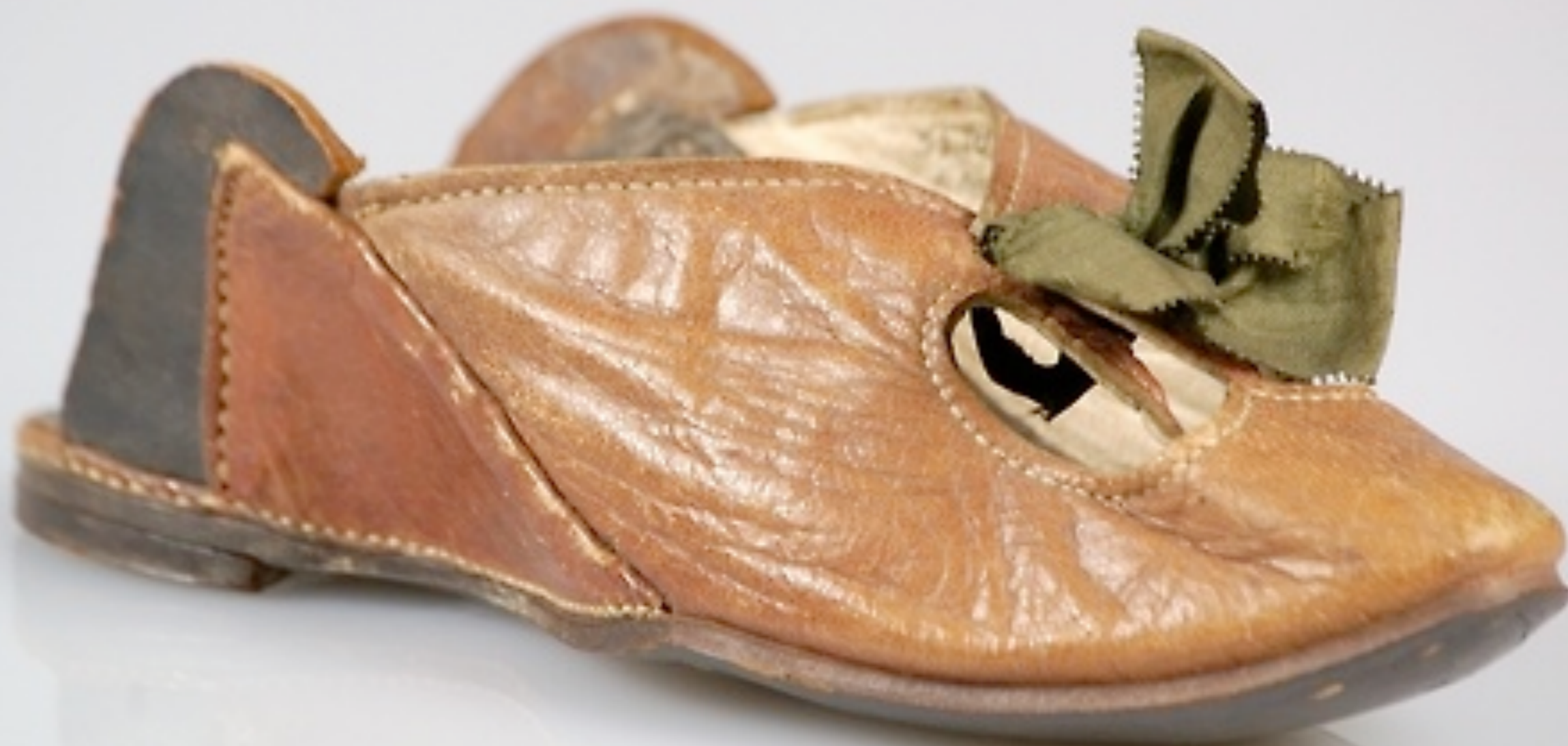
Leather Clog Early 18th Century (Metropolitan Museum of Art)