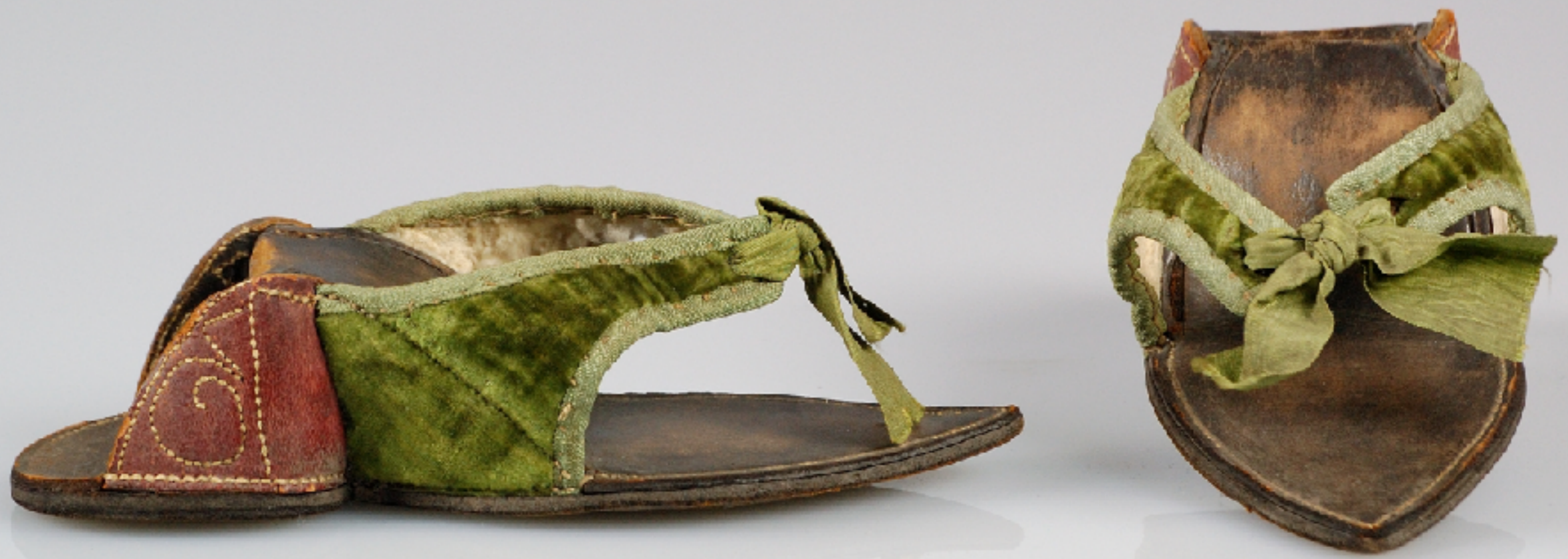
English Silk & Leather Clog Early 18th Century (Metropolitan Museum of Art)