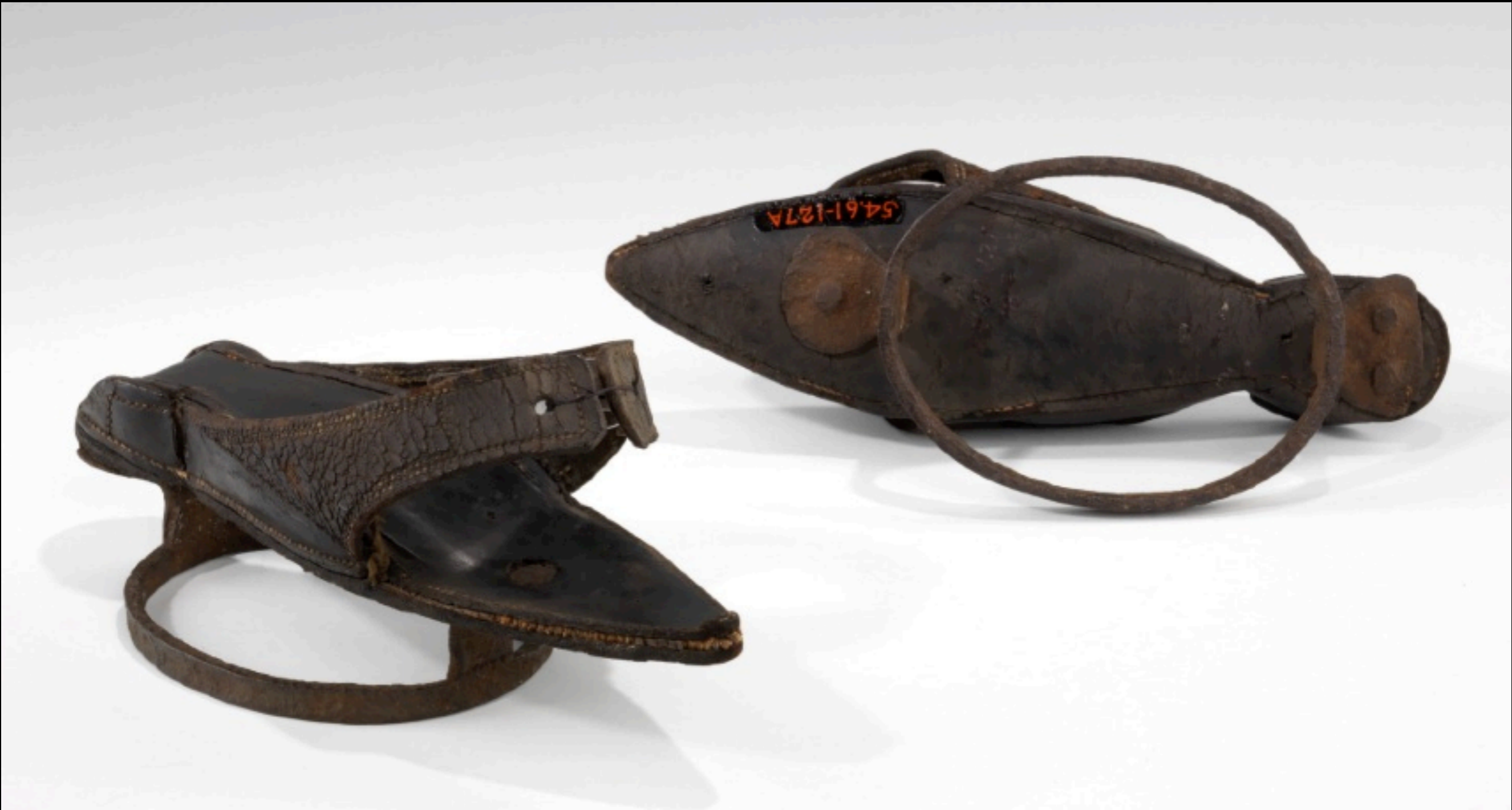
European Leather & Iron Ring Pattens 18th Century (Metropolitan Museum of Art)