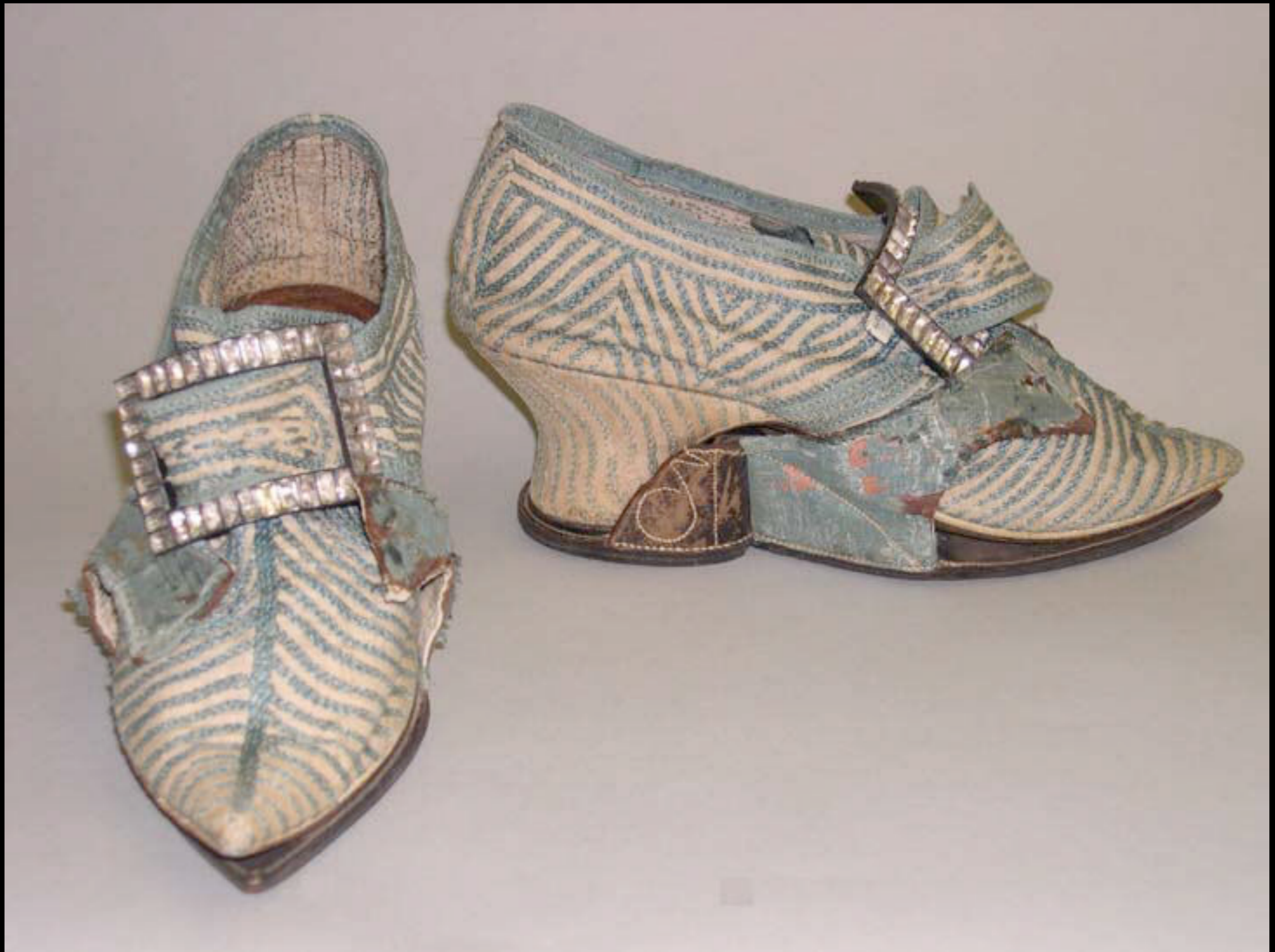
English Silk Buckle Shoes on Silk & Leather Clogs with Matching Shoes