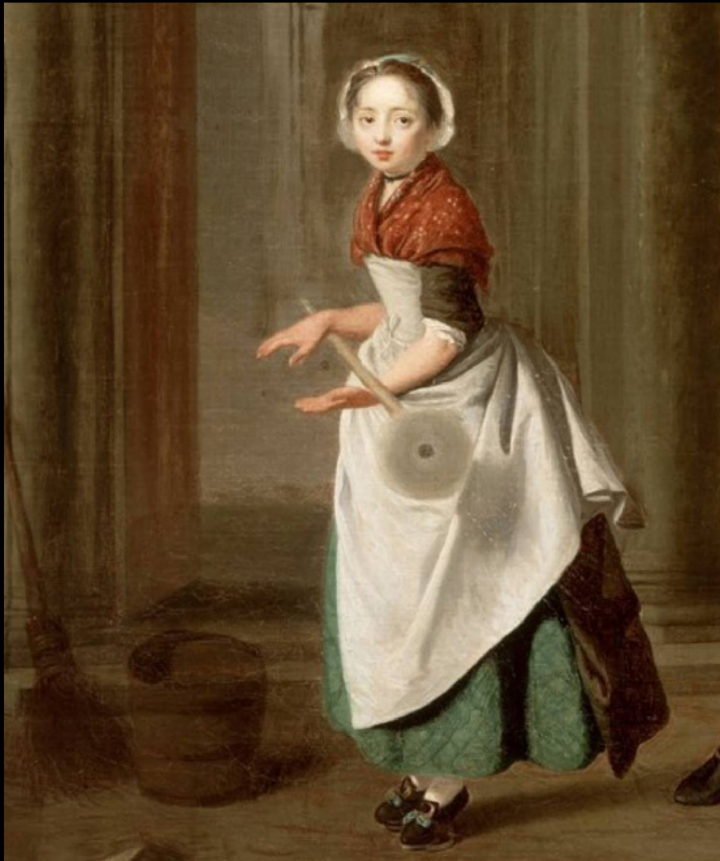
"A City Shower" by Edward Penny 1764 (Museum of London)