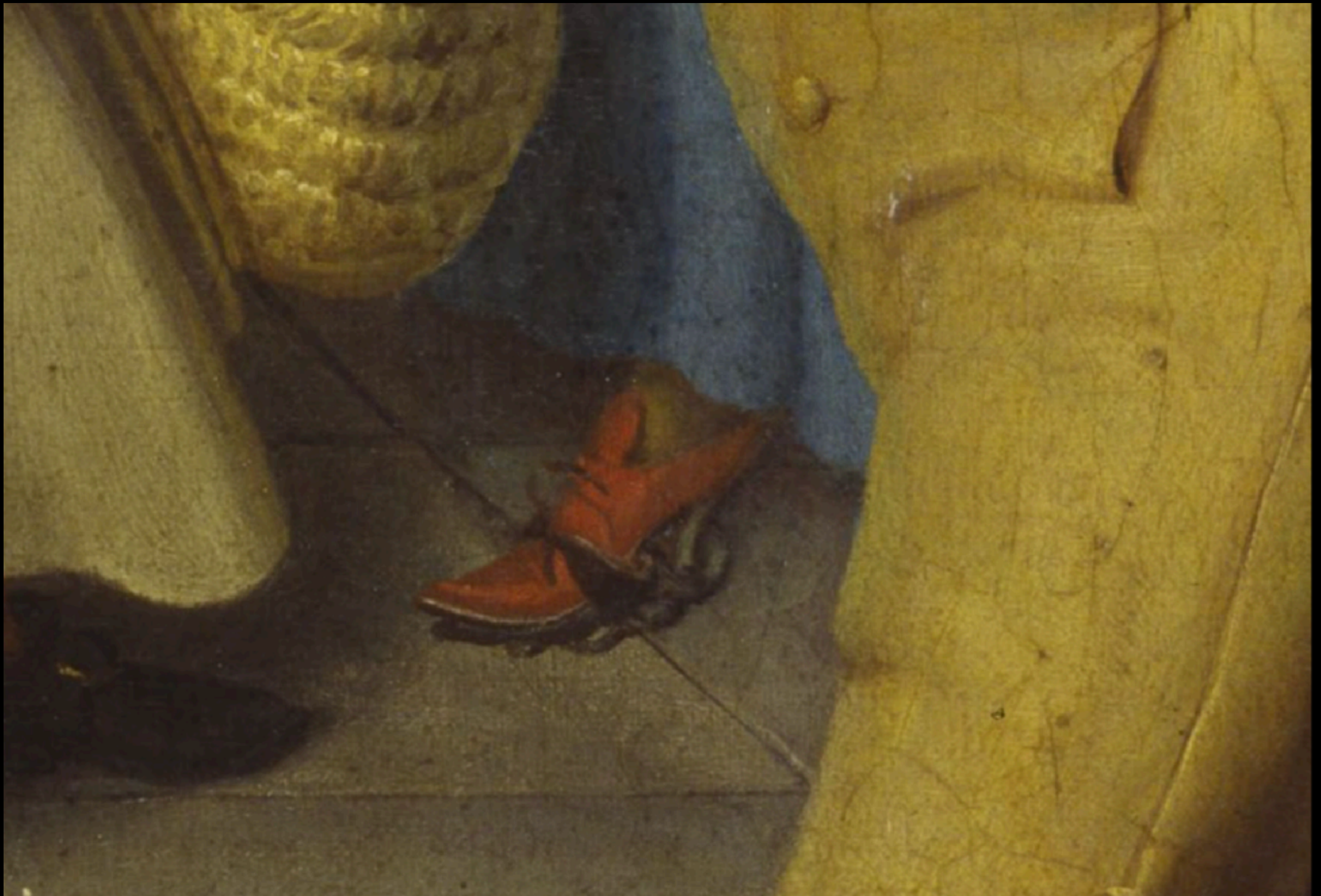
Patten Detail: "Boxkampf in London" by Andreas Moller c. 1737 (Museum Kassel)