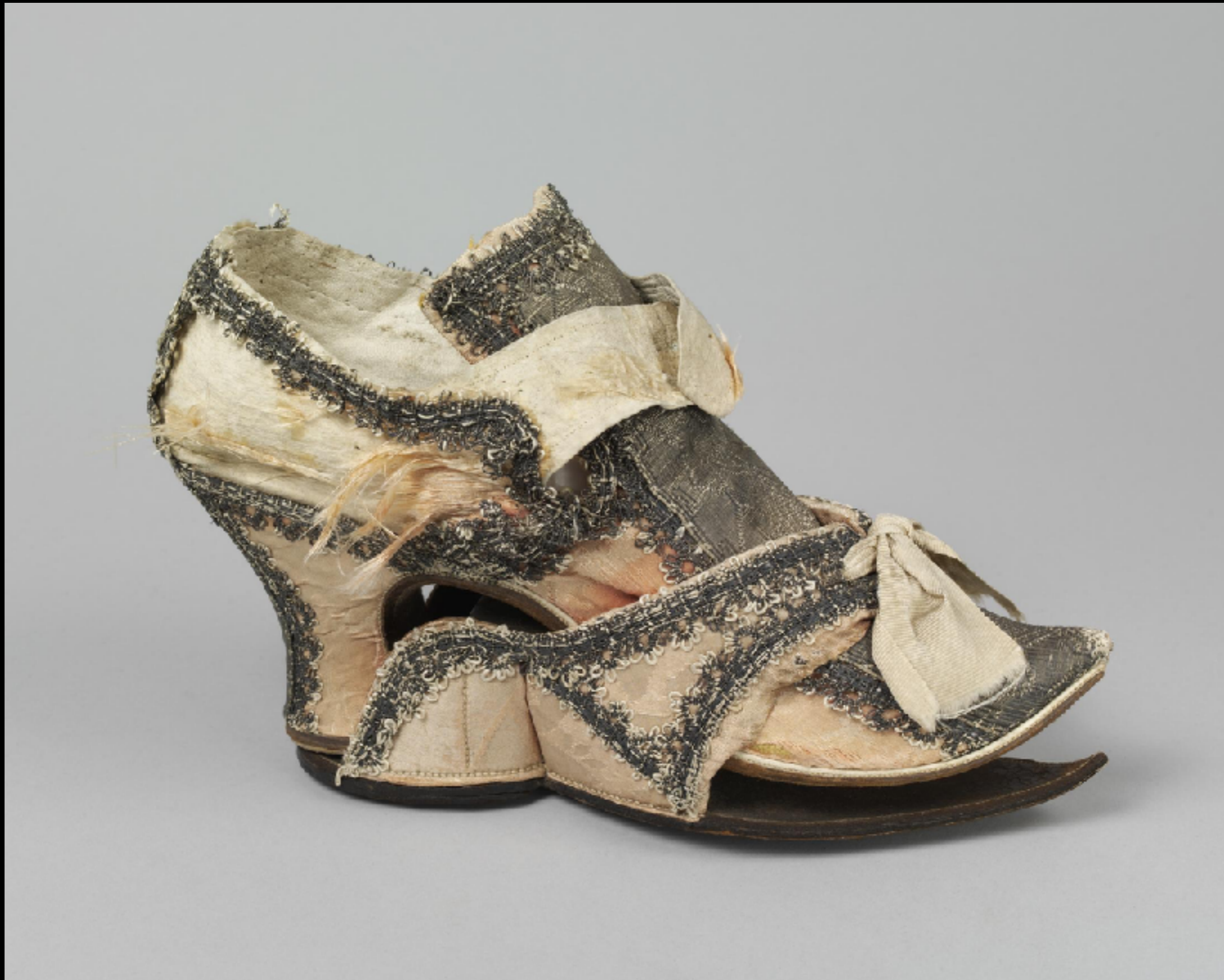
English Silk, Metallic Lace, & Leather Clog with Matching Shoe