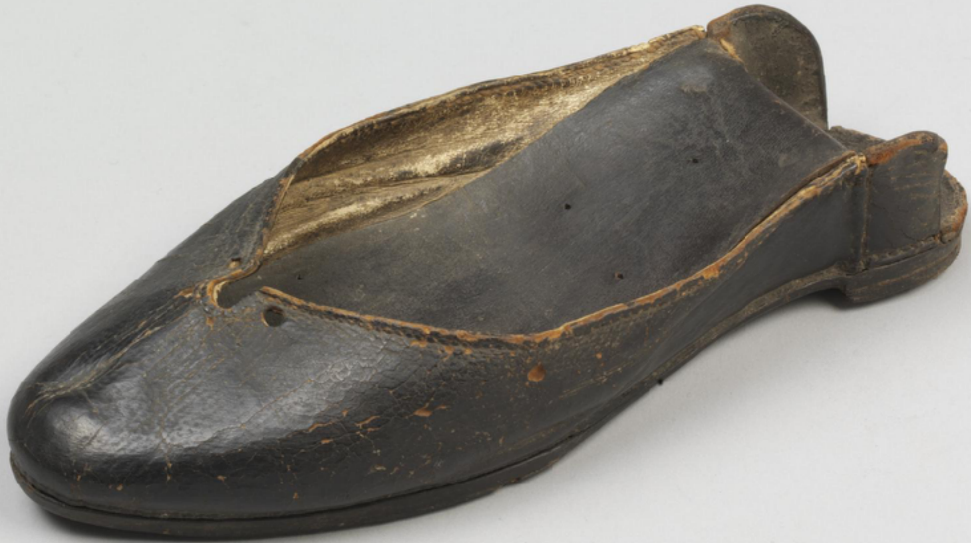
English Leather Clog 18th Century (Victoria & Albert)