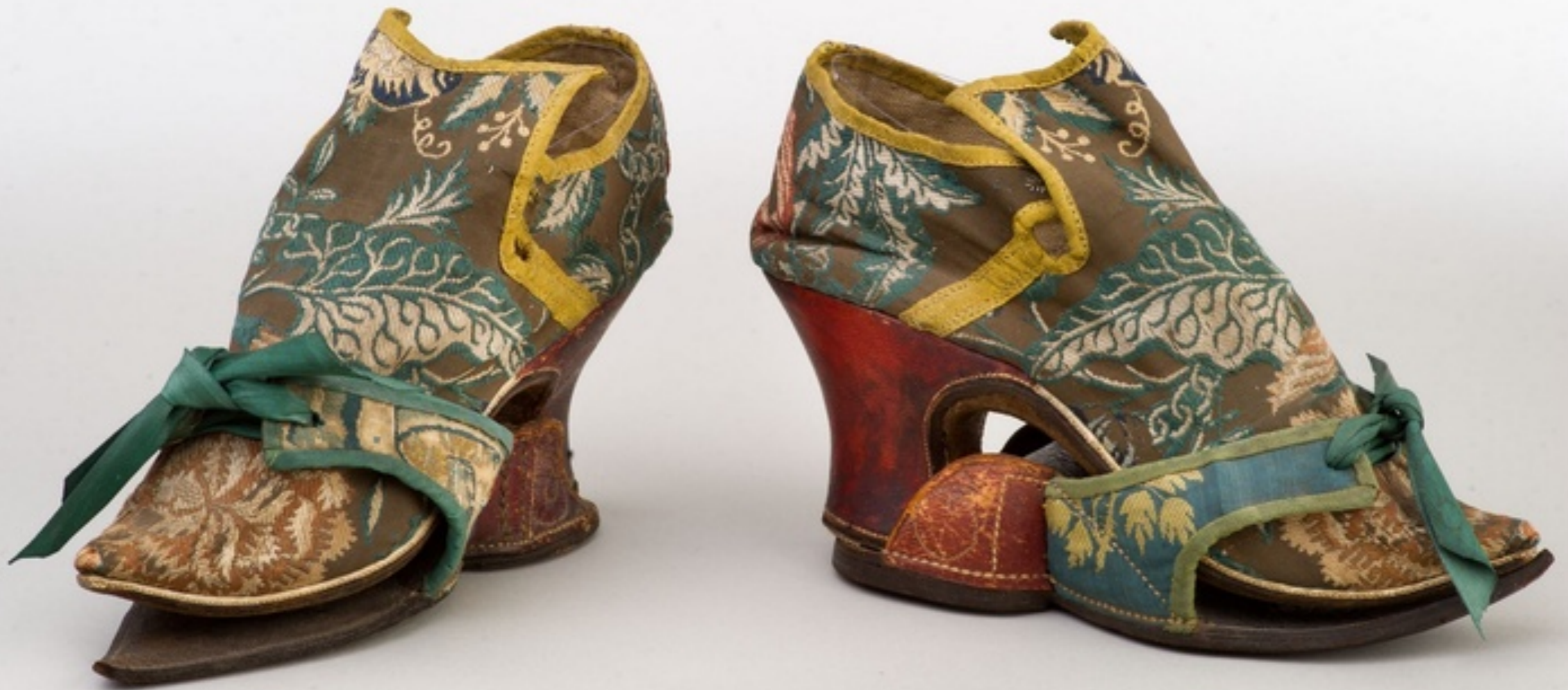
English Silk & Leather Clogs with Matching Shoes Early 18th Century (Shelburne Museum)