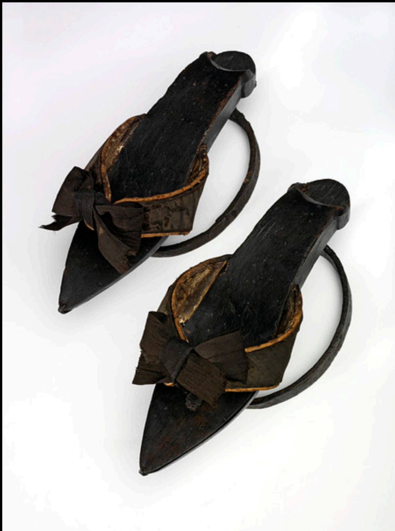
English Wood, Leather & Iron Ring Pattens