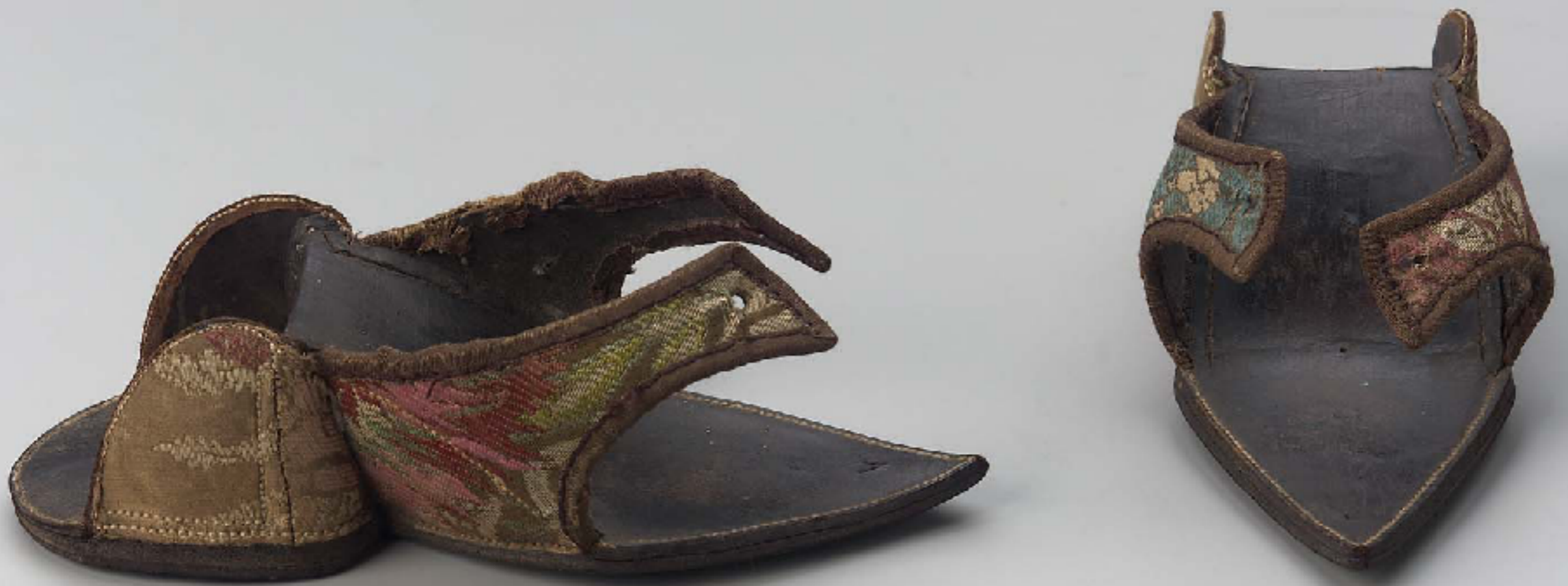
French Silk & Leather Clogs Early - Mid 18th Century (Museum of Fine Arts, Boston)