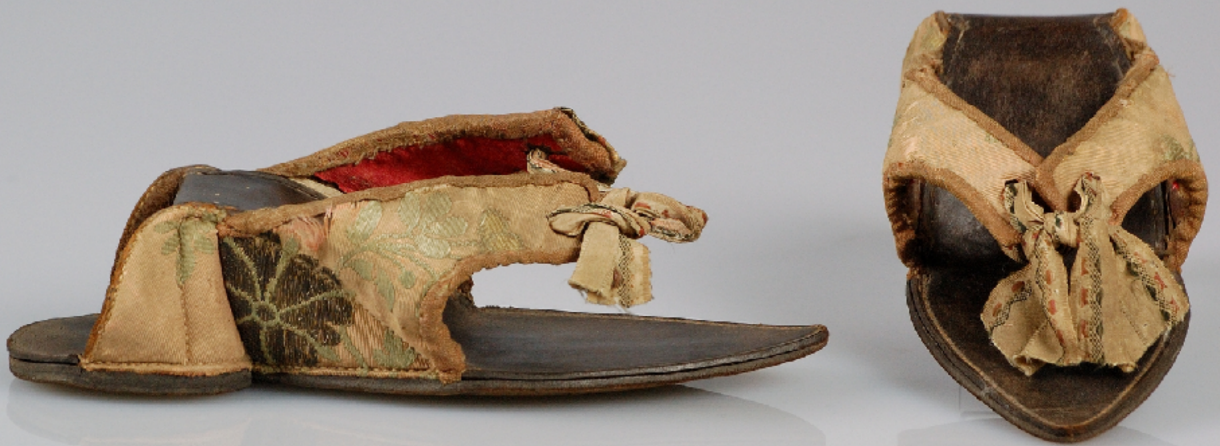
European Silk & Leather Clog Early 18th Century (Metropolitan Museum of Art)