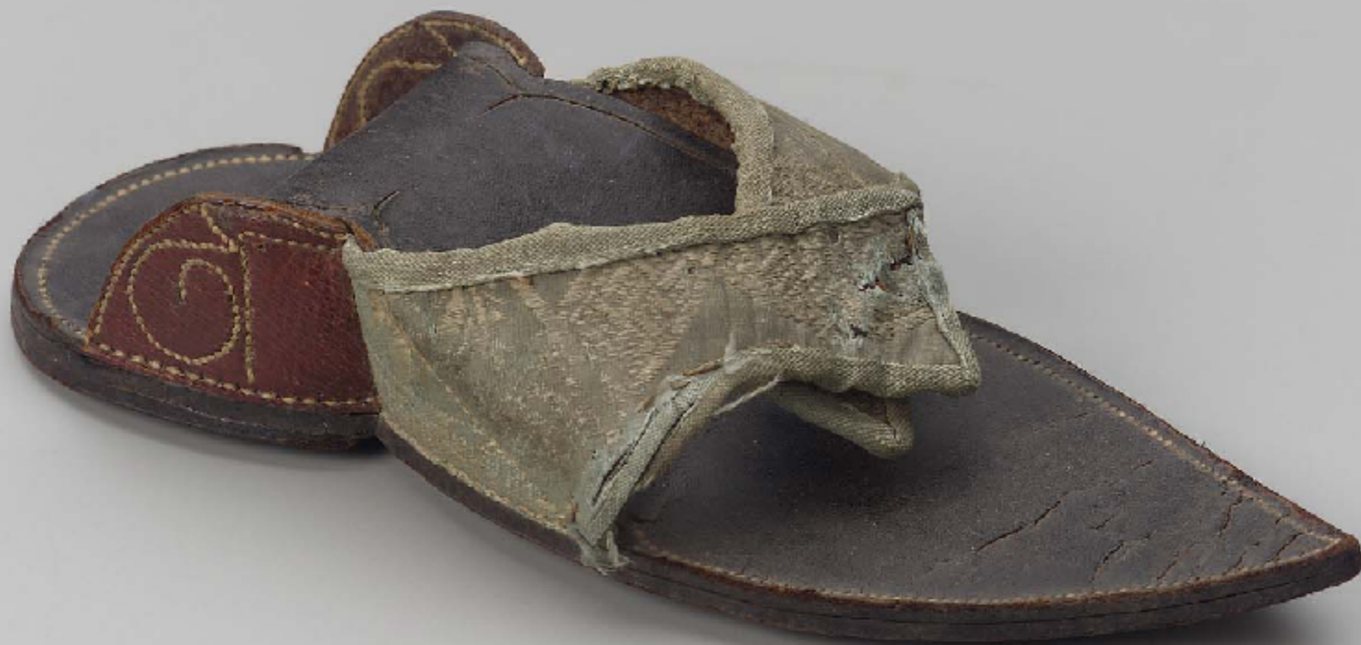
English Silk & Leather Clog c. 1700 - 1750 (Museum of Fine Arts, Boston)