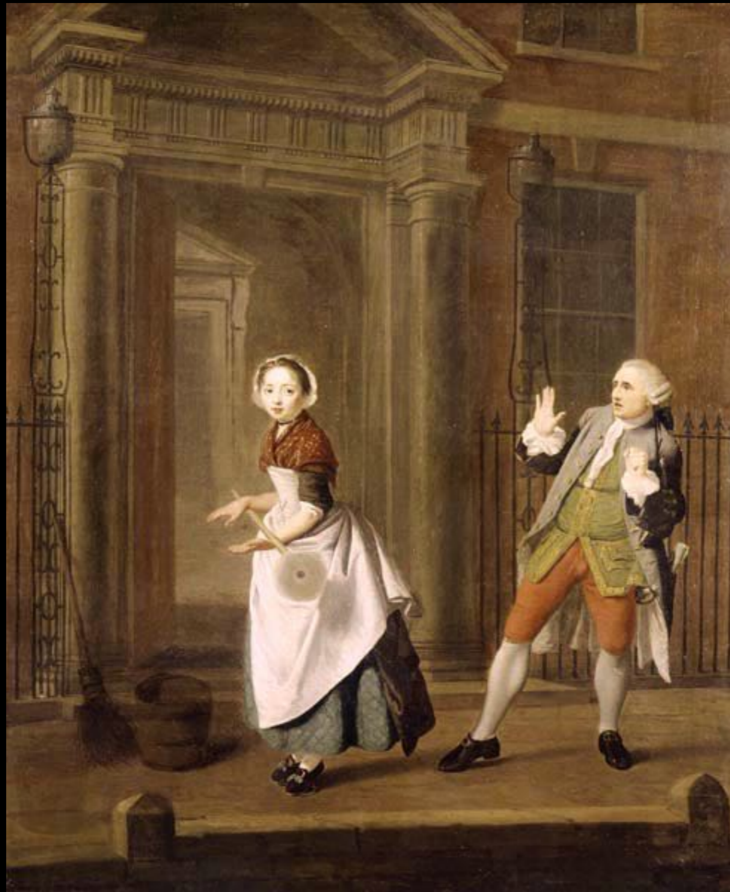
“A City Shower” by Edward Penny 1764 (Museum of London)