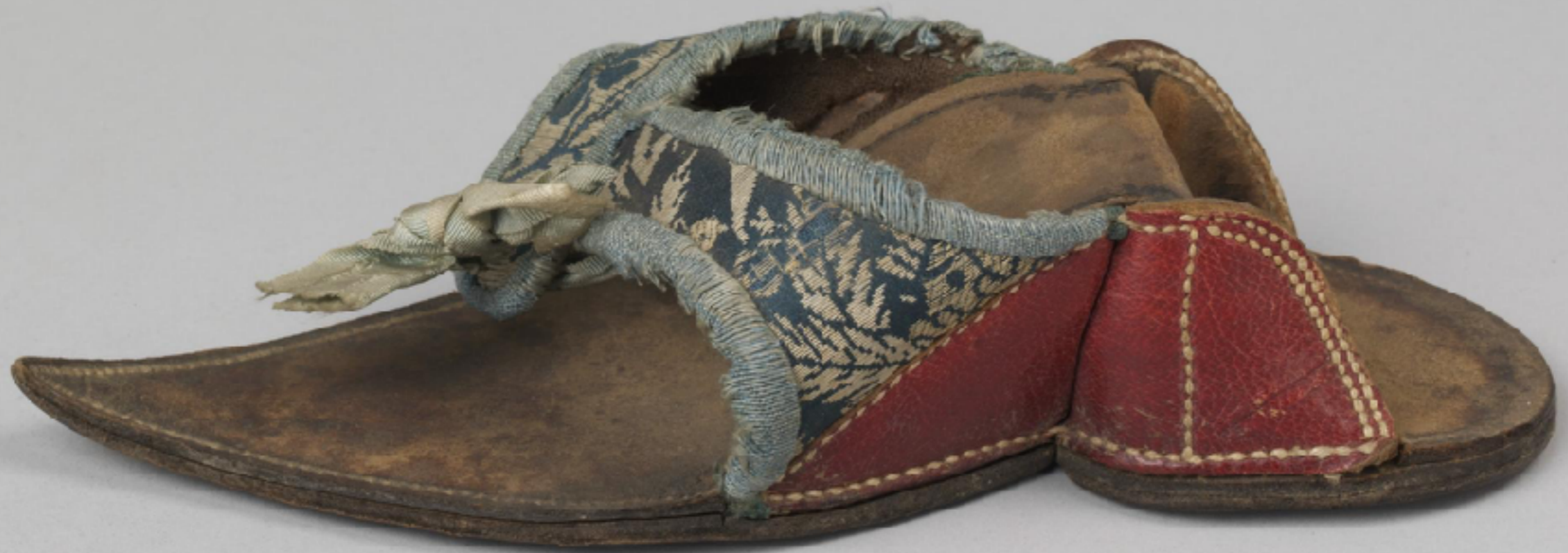
European Clog Early - Mid 18th Century (Victoria & Albert)