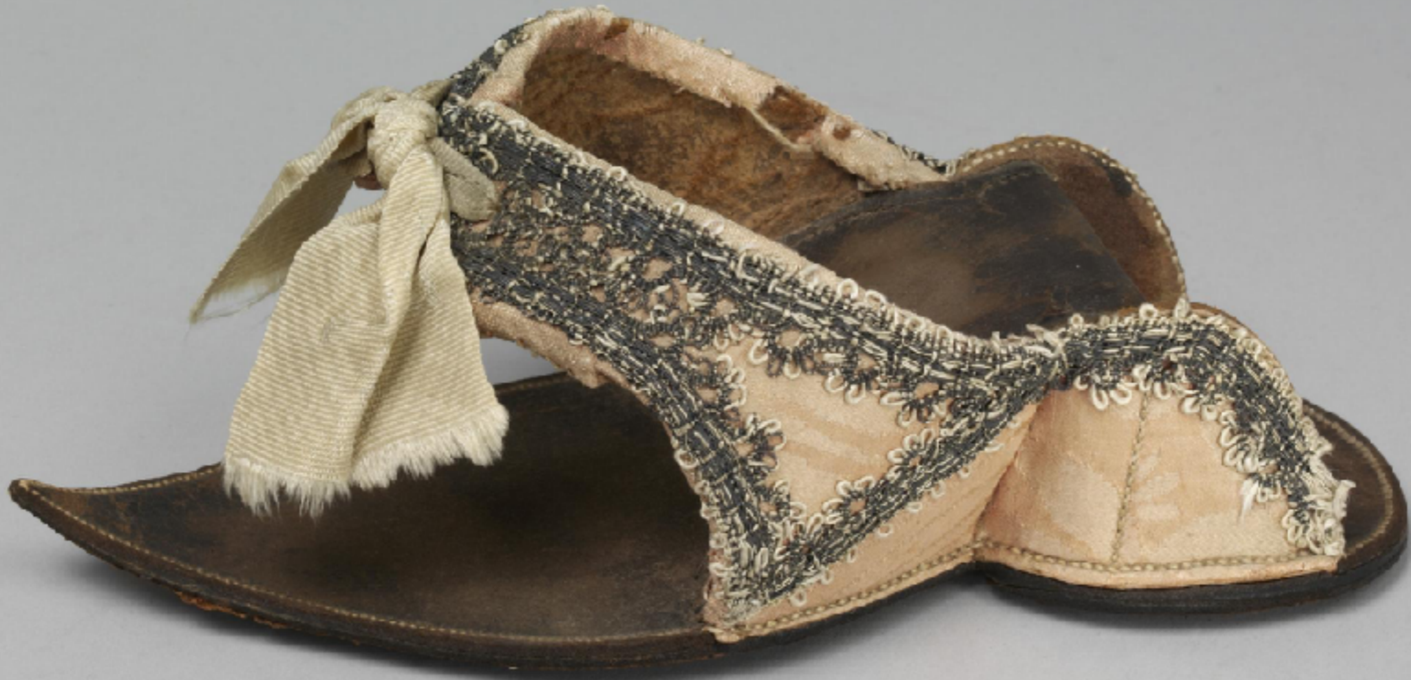
English Silk, Metallic Lace, & Leather Clog