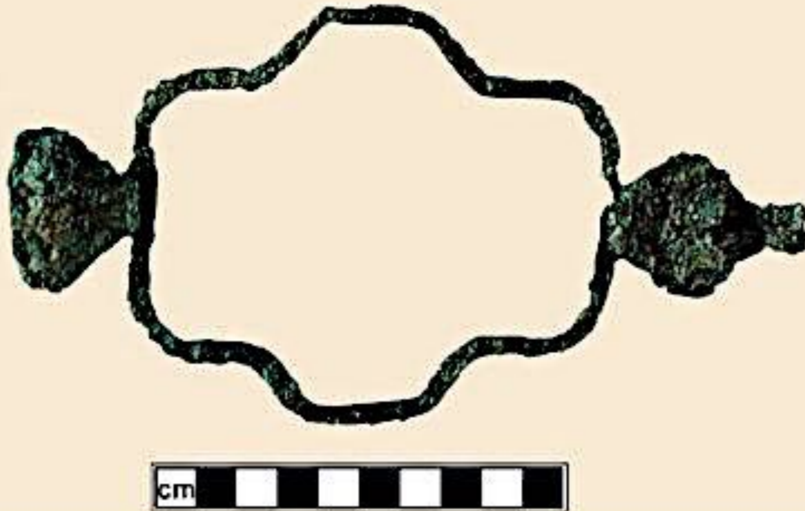
Iron patten components from Avery's Rest Site, as seen from above (Photo courtesy of the Maryland Archaeological Conservation Laboratory).

Iron Ring from a Patten Recovered from Avery's Rest Site, Delaware (Maryland Archeological Conservation Laboratory)