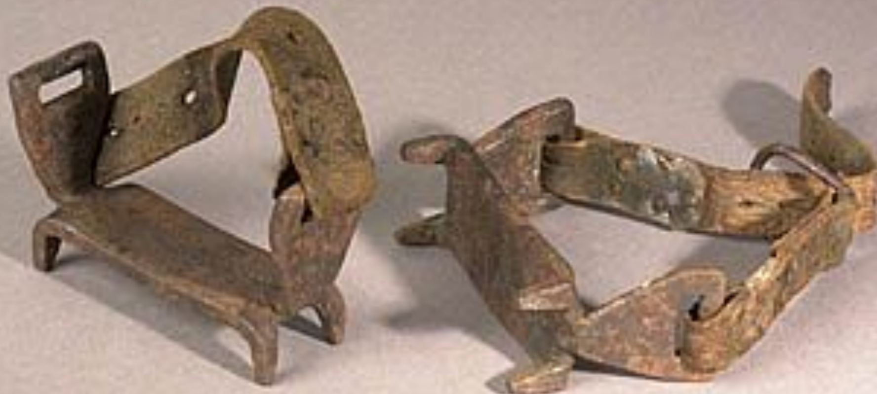
Ice Creepers 18th - Early 19th Century (National Park Service)