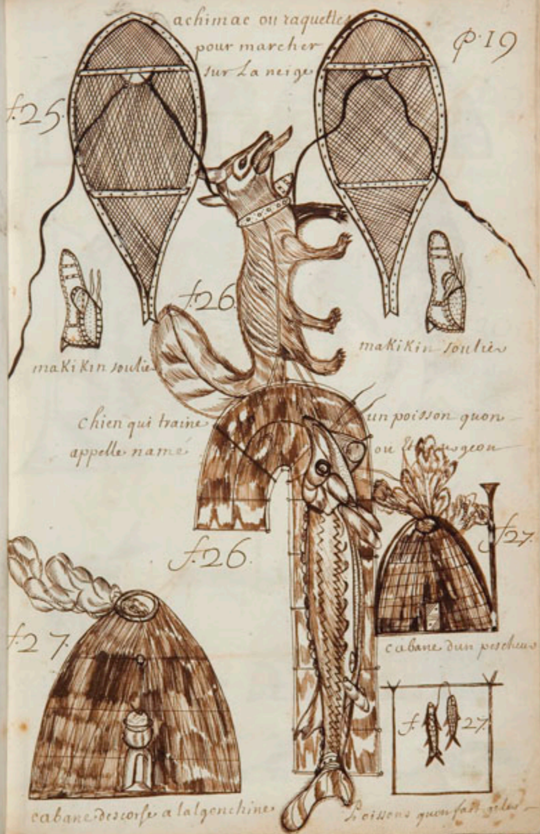
“Codex Canadensis” by Charles Becard de Granville c. 1700 (Gilcrease Museum, Tulsa, Oklahoma)