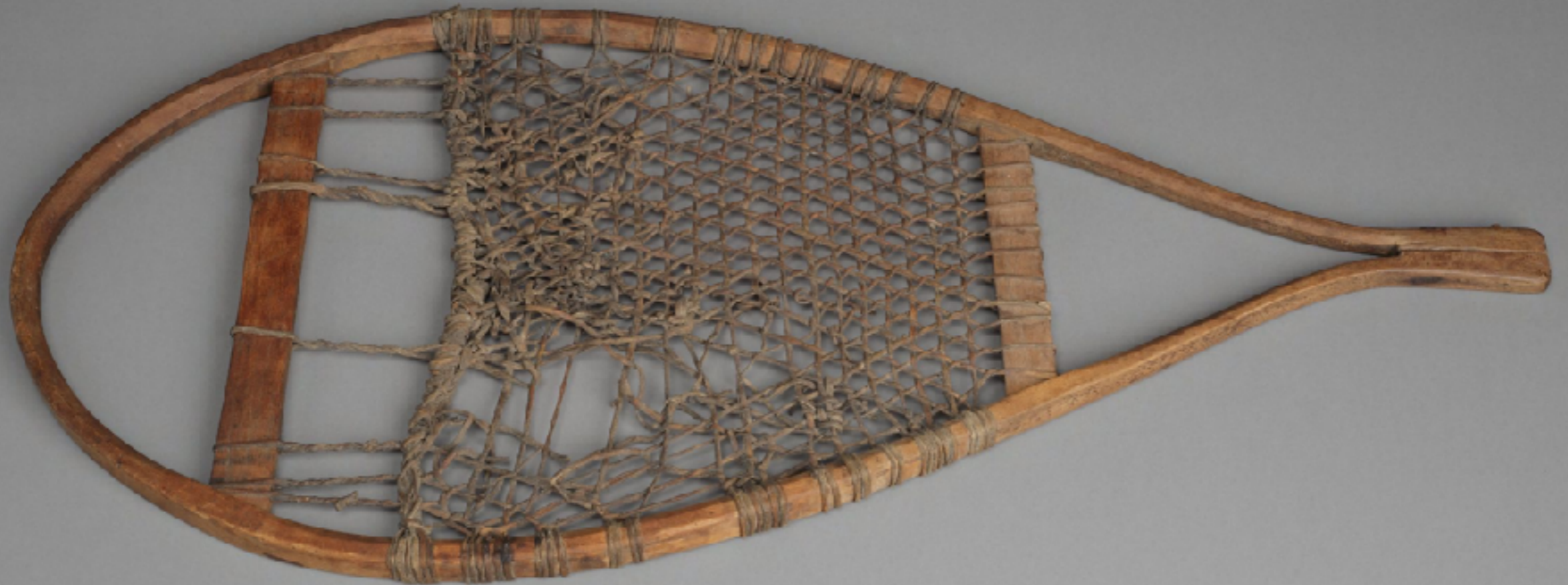
American Snowshoes of General Artemas Ward c. 1768 (General Artemas Ward House Museum)