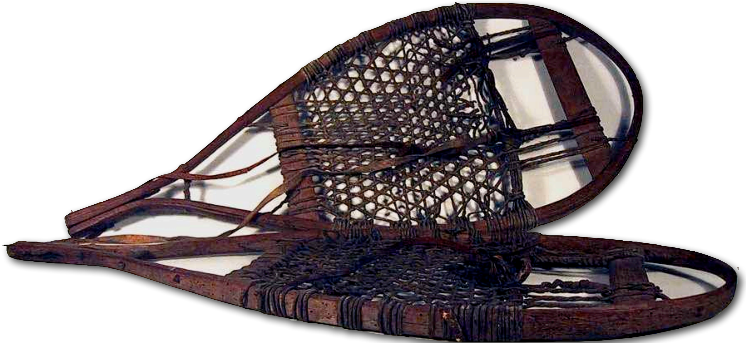
Snowshoes Owned by Colonel Arent de Peyster of the King's 8th Regiment of Foot, Native of New York City