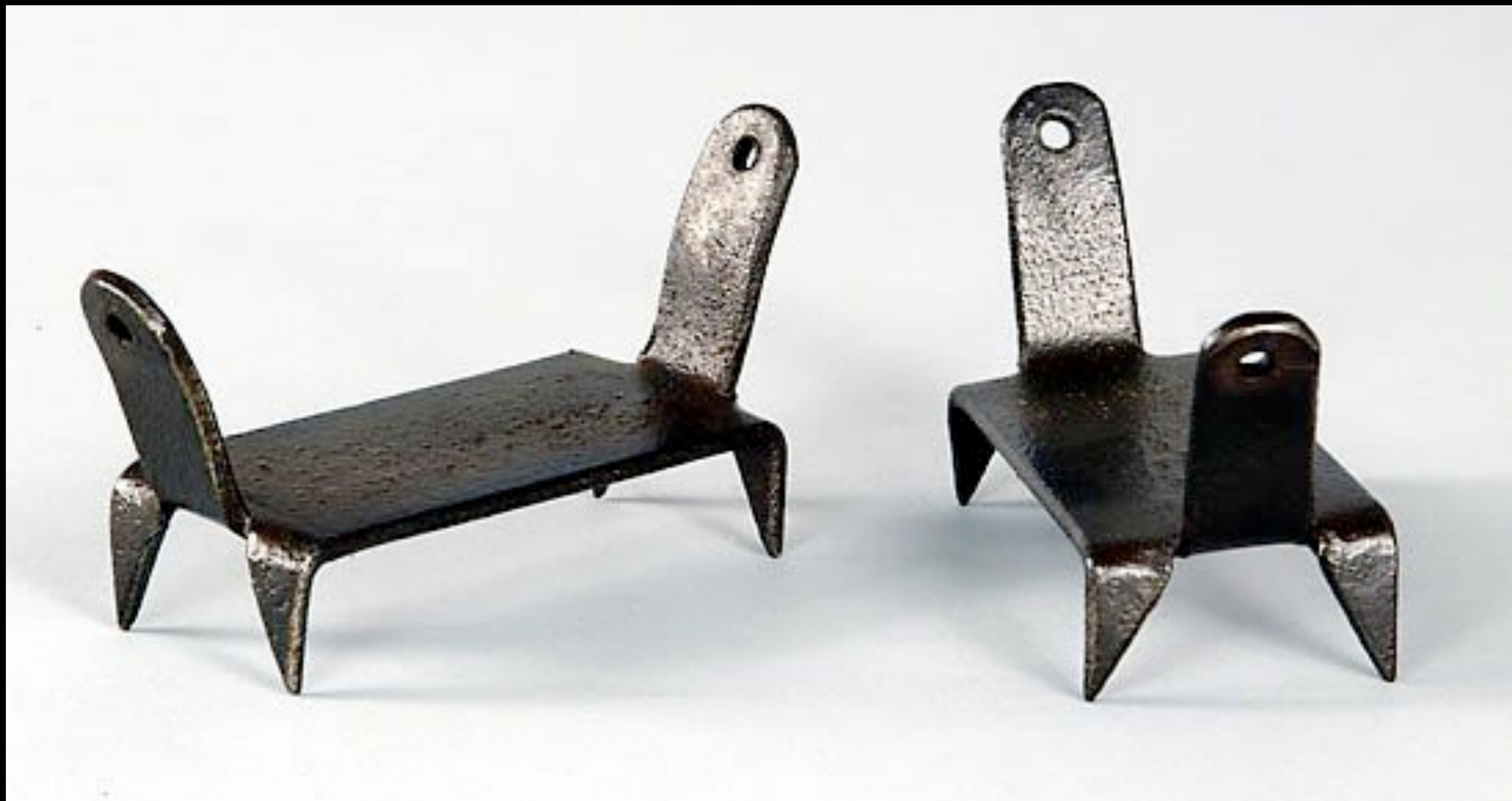
Ice Creepers 18th - Early 19th Century (Private Collection)