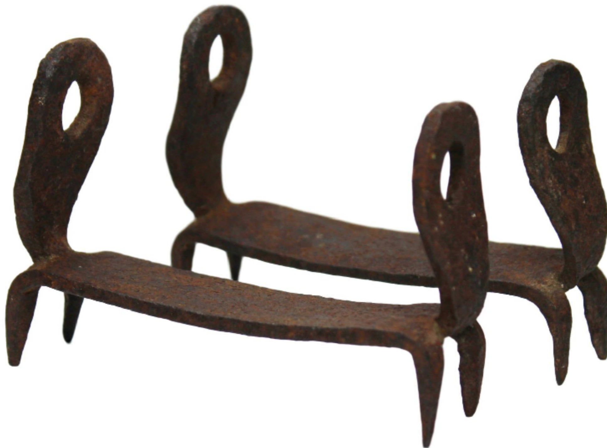
Ice Creepers 18th - Early 19th Century (Guillame Ouest)