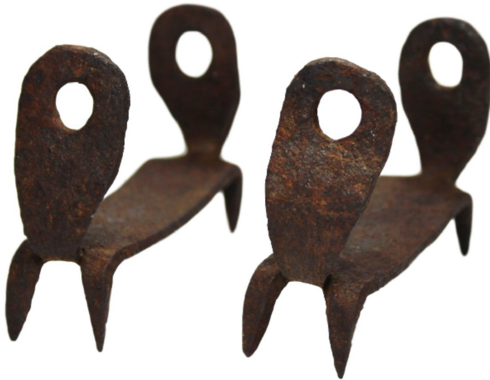
Ice Creepers 18th - Early 19th Century (Guillame Ouest)