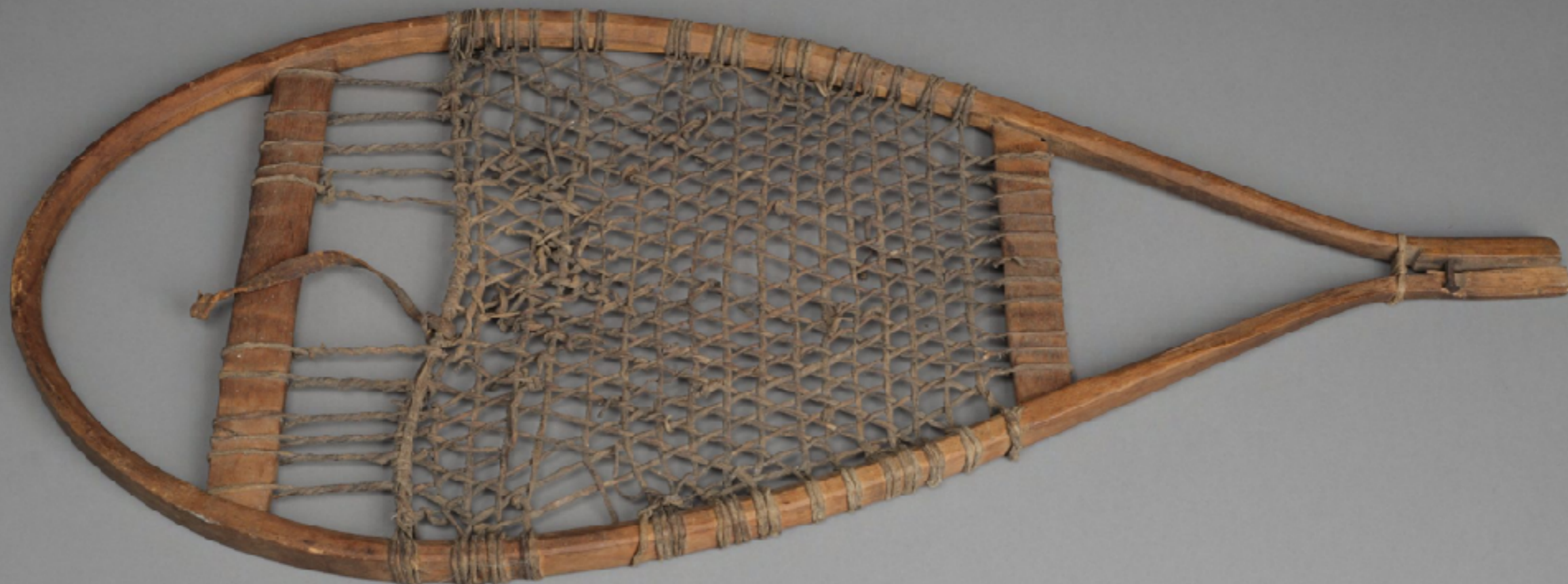
American Snowshoes of General Artemas Ward c. 1768 (General Artemas Ward House Museum)