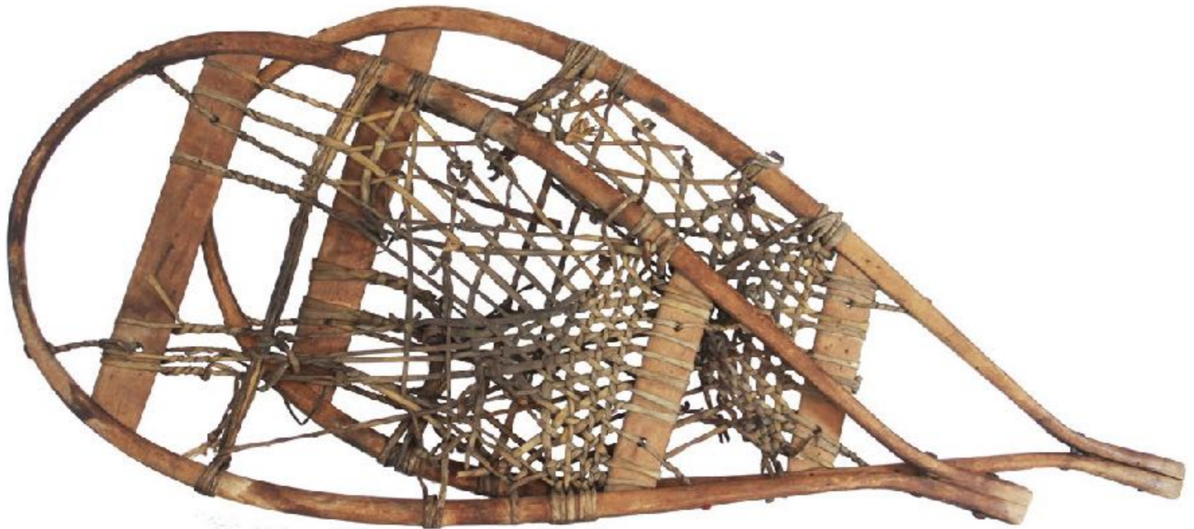
American Snow Shoes Dated 1780 (Private Collection)