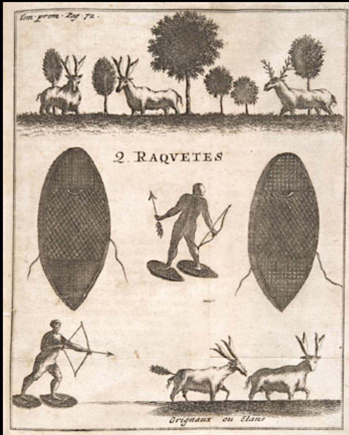
Native American Snowshoes in New France From "New voyages to North-America containing an account of several nations" by Louis Armand de Lom d'Arce, Baron de Lahontan 1703 (Library & Archives, Canada)