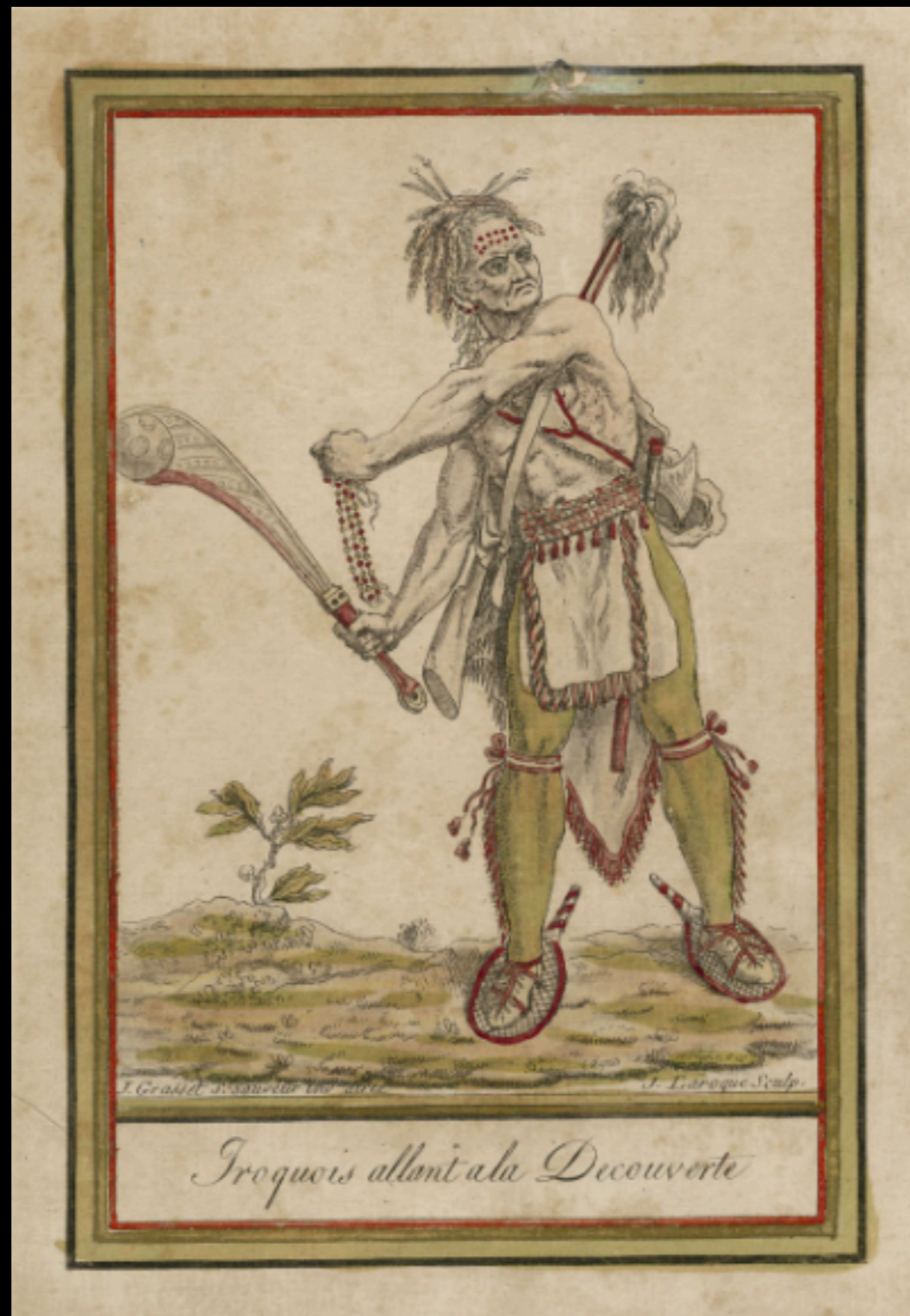
“Iroquois allant à la Découverte” by J.G. de St. Sauveur c. 1795