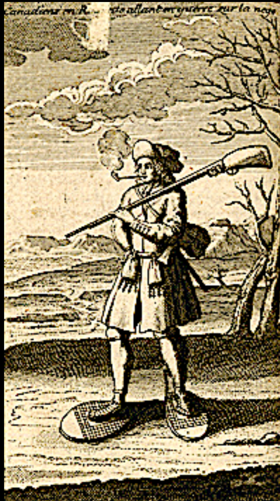
Canadian with Snowshoes Going to War on the Snow From "Histoire de l'Amerique Septentrionale" by Bacqueville de La Potherie (1663-1736) Published in 1753 (Public Domain)