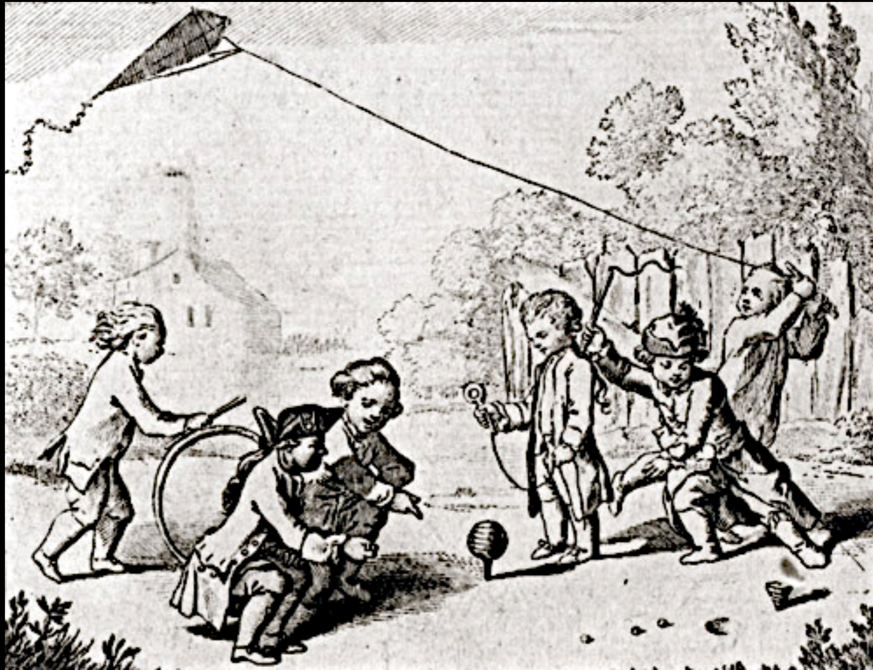
Print from "Elementarwerke für die Jugend und ihre Freunde" by John Bernhard Basedow of Berlin, Germany 1774