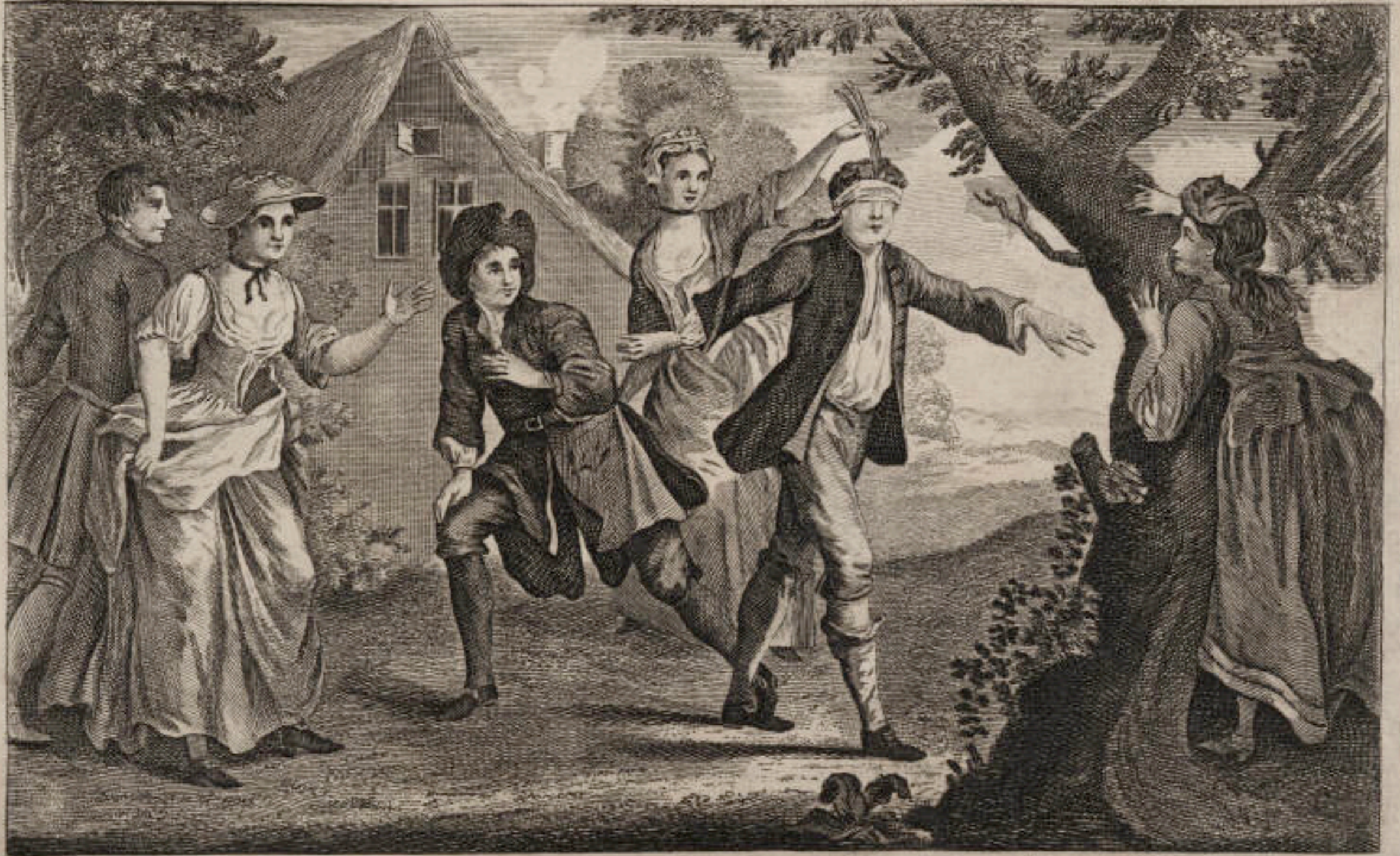
The Humorous Diversion of the Country Play at BLINDMAN'S BUFF Engraved from an Original Painting in Vauxhall Gardens.

“The Humourous Diversion of the Country Play at BLINDMAN’S BUFF: Engraved from an Original Painitng in Vauxhall Gardens” by Robert Sayer, c. 1750