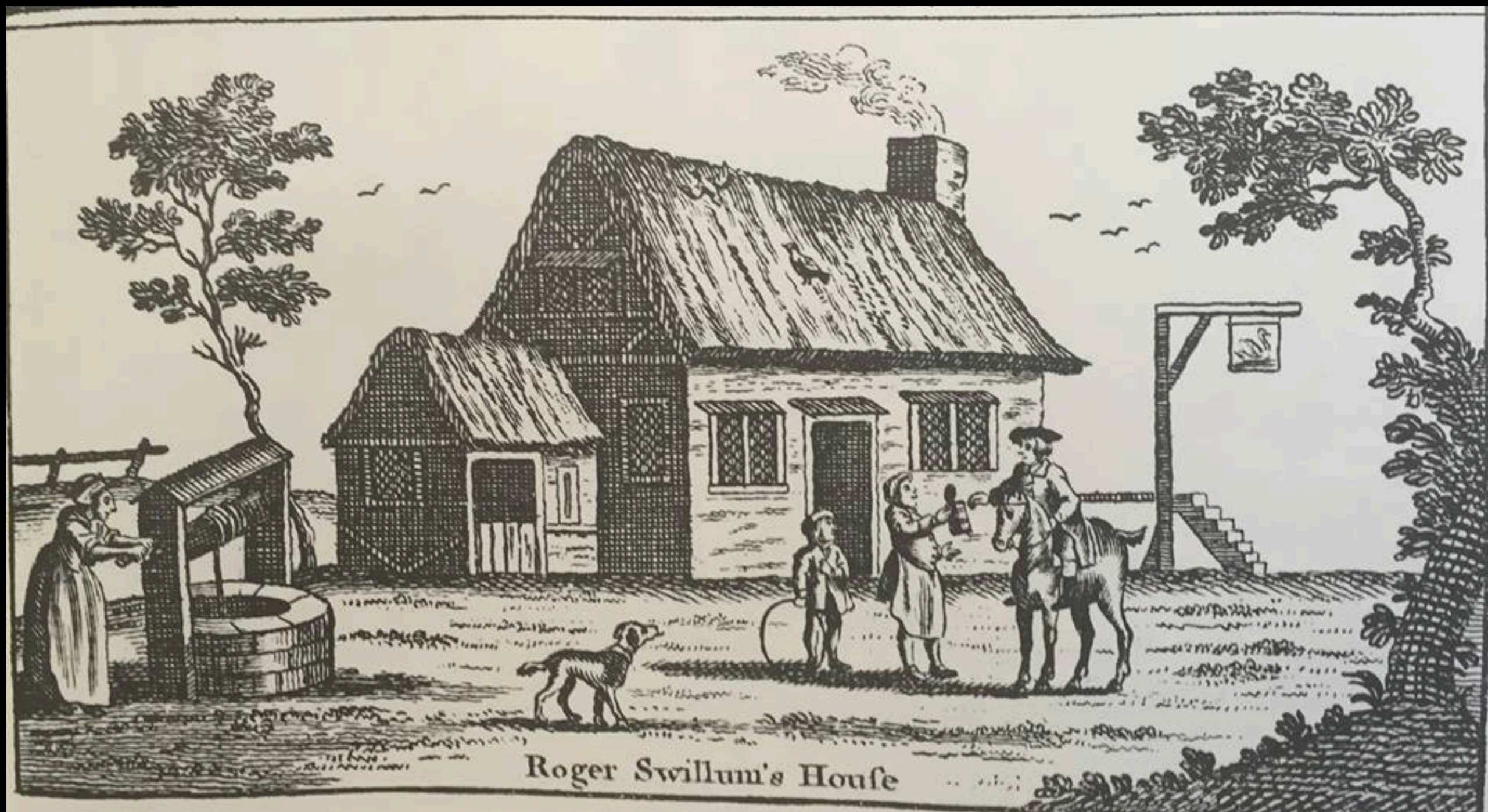
Woodcut by Bowles & Carver c. 1780 - 1795 (Private Collection)