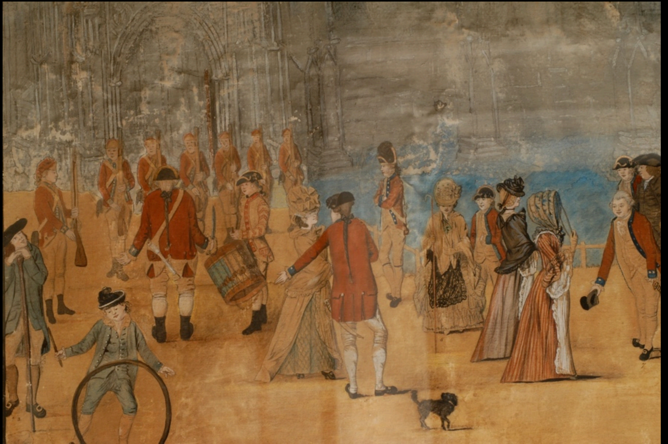
Royal South Gloucestershire Militia Drilling on College Green, Gloucester Cathedral English School c. 1778 (Soldiers of Gloucestershire Museum)