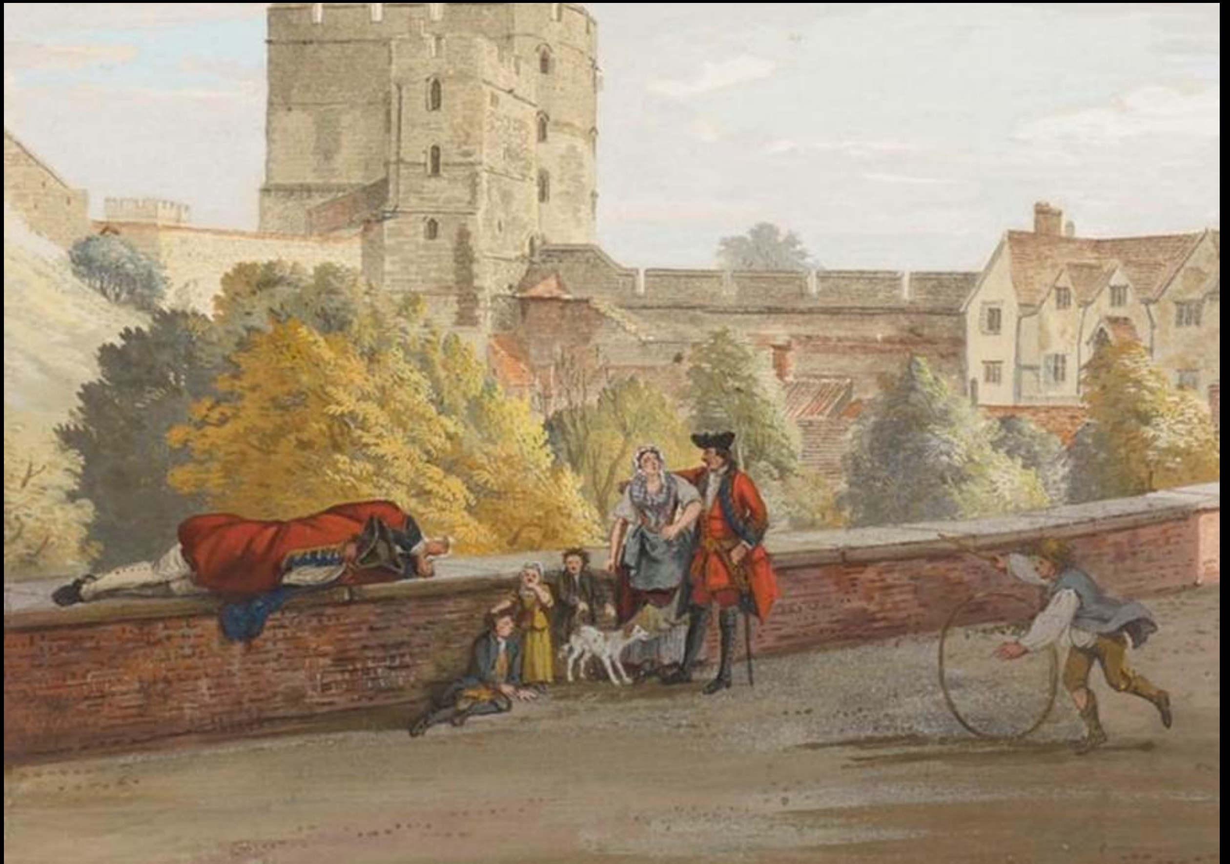
A View of the Round and Devil's Towers, Windsor Castle by Paul Sandby (The Royal Collection)