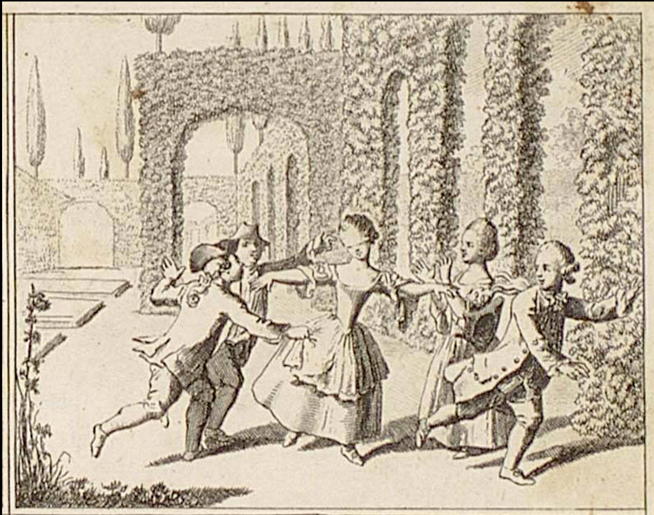
Blind Man's Bluff from a German Children's Book by Daniel Chodowiecki c. 1770