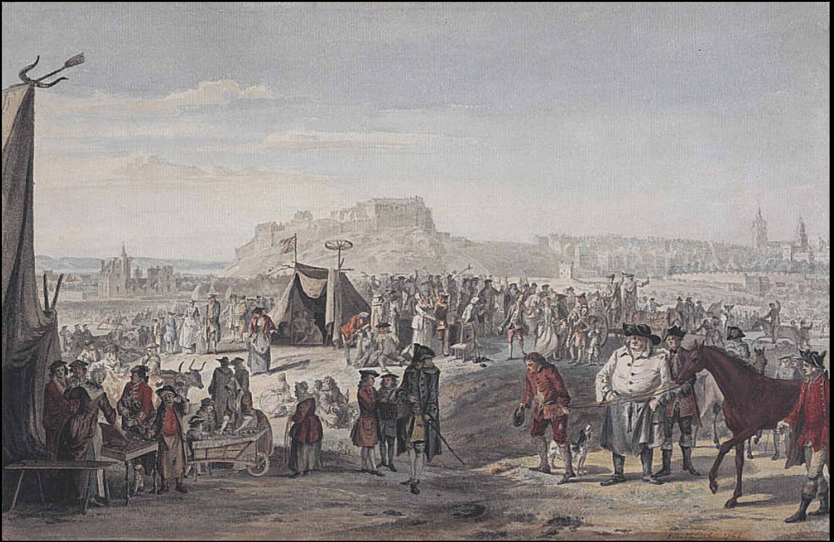
“Horse Fair on Bruntsfield Links” by Paul Sandby (National Galleries Scotland)