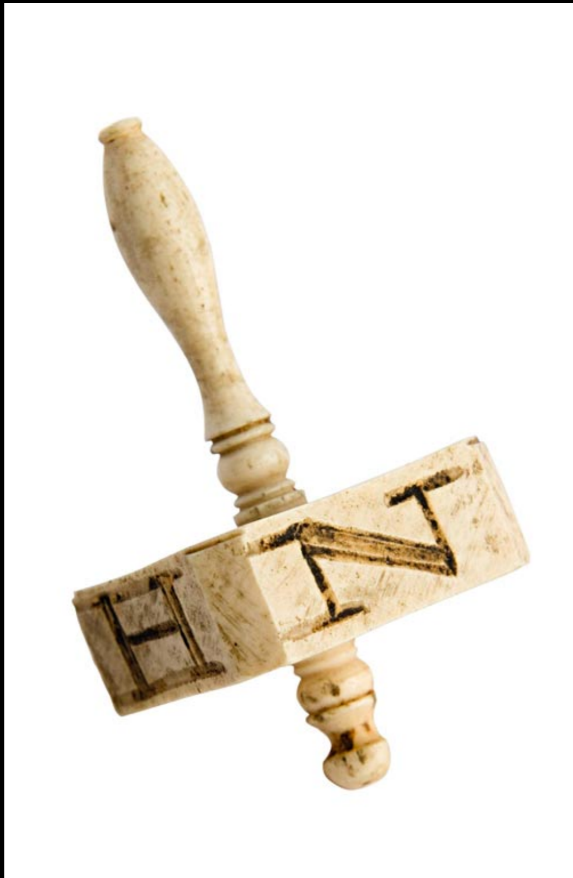
Ivory Spinning Top for "Put & Take" ("H" for Take Half, "N" for Nothing, "P" for Put In, and "T" for Take)