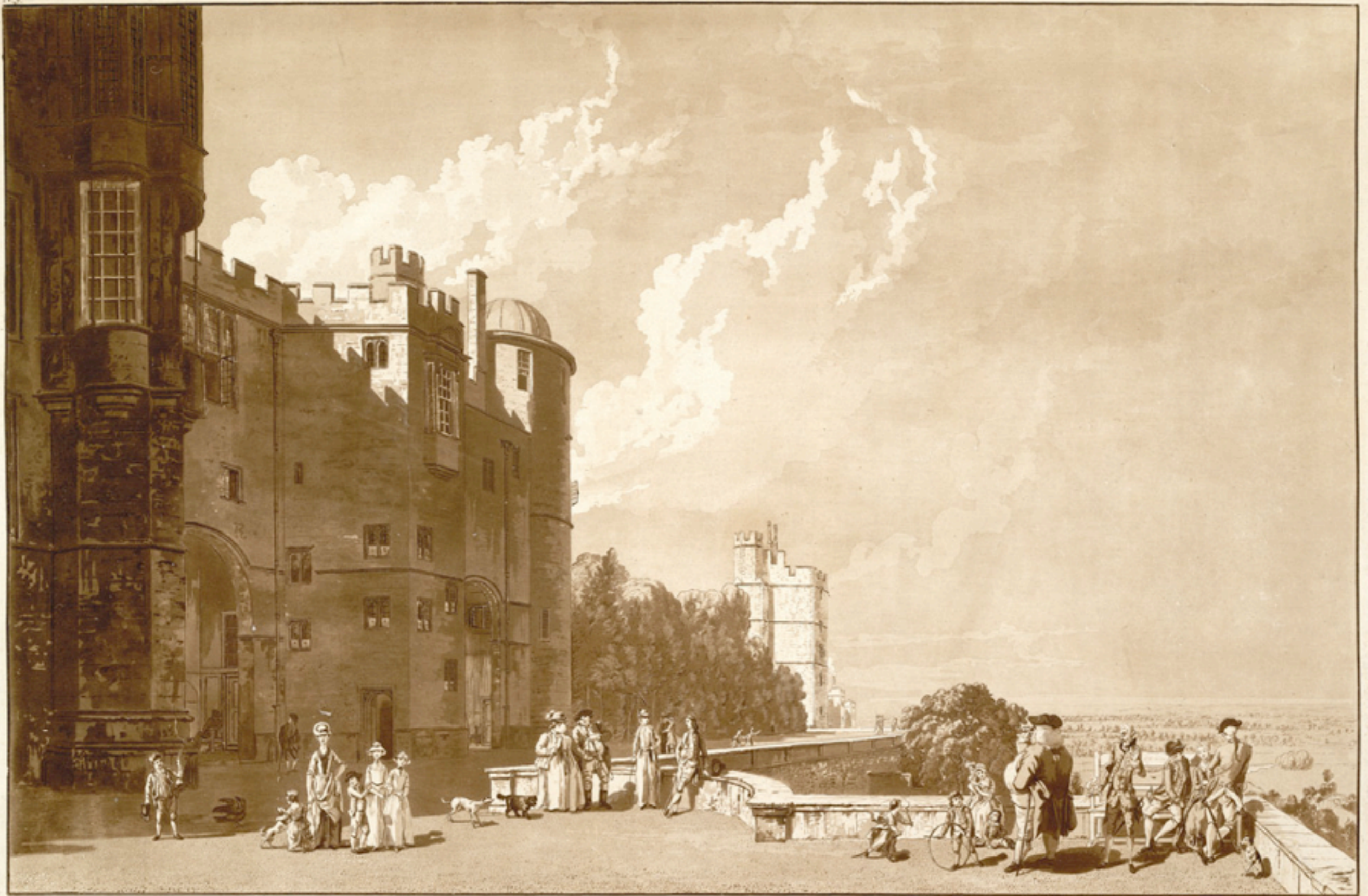
Windsor Terrace Looking South by Paul Sandby c. 1765