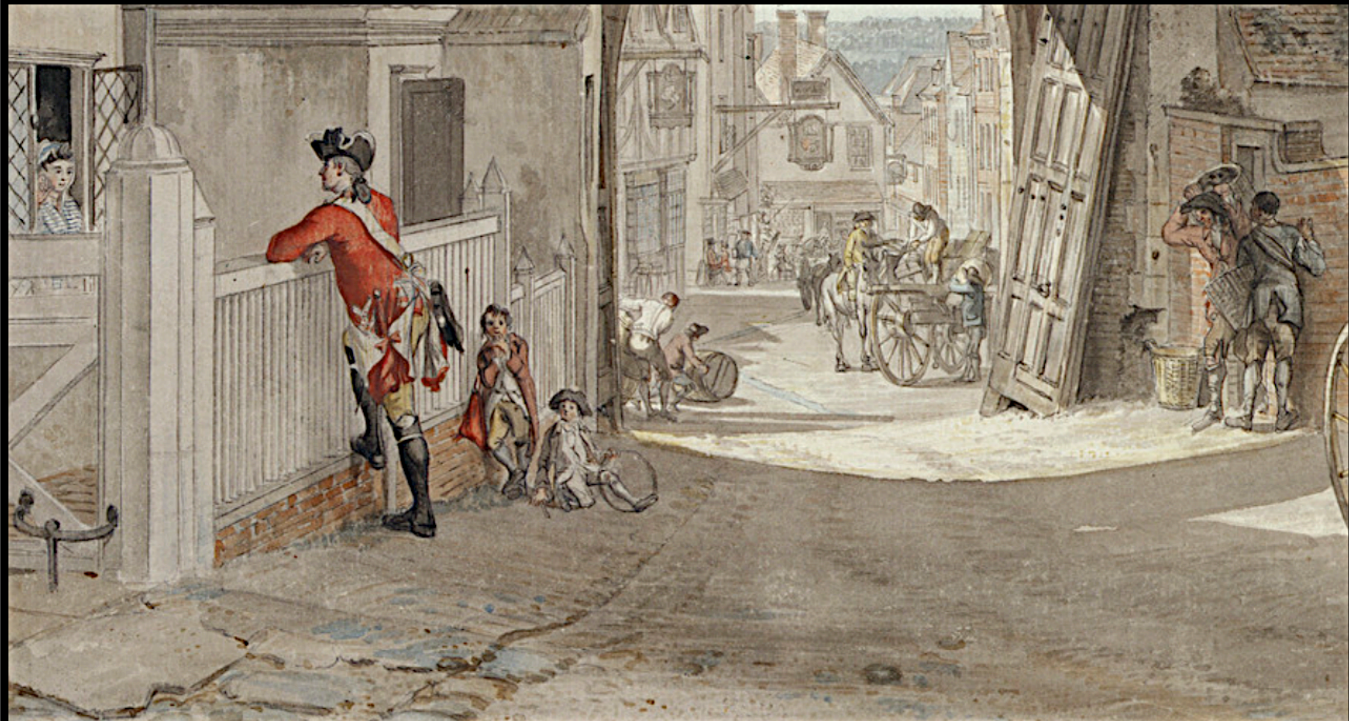
The Town Gate Looking Westwards down Castle Hill, Windsor by Paul Sandby c. 1765 (Royal Collection)