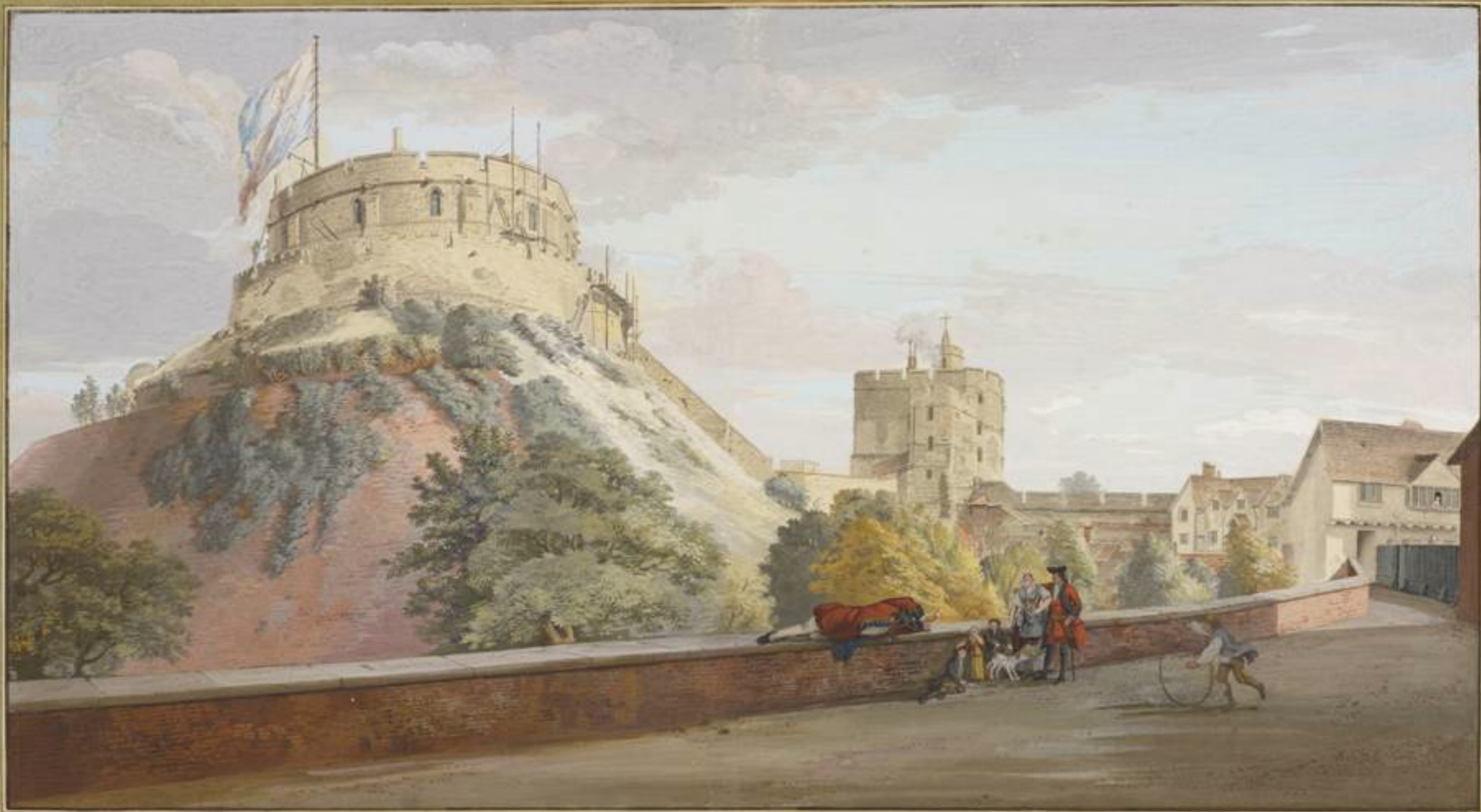
A View of the Round and Devil's Towers, Windsor Castle by Paul Sandby (The Royal Collection)