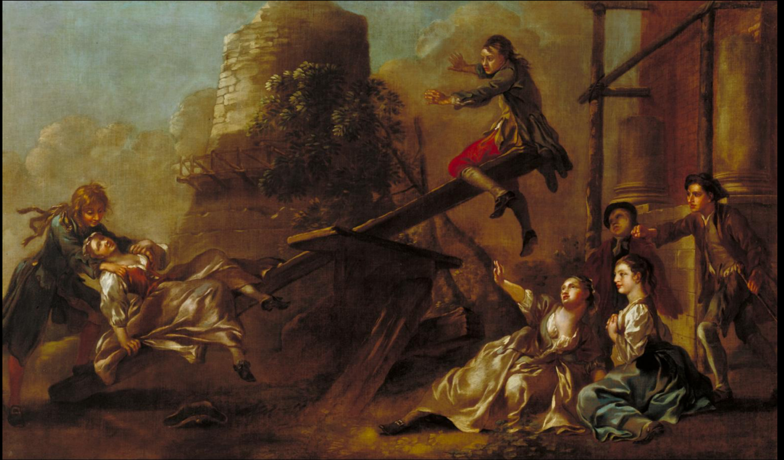
"See - Saw" by Francis Hayman c. 1742