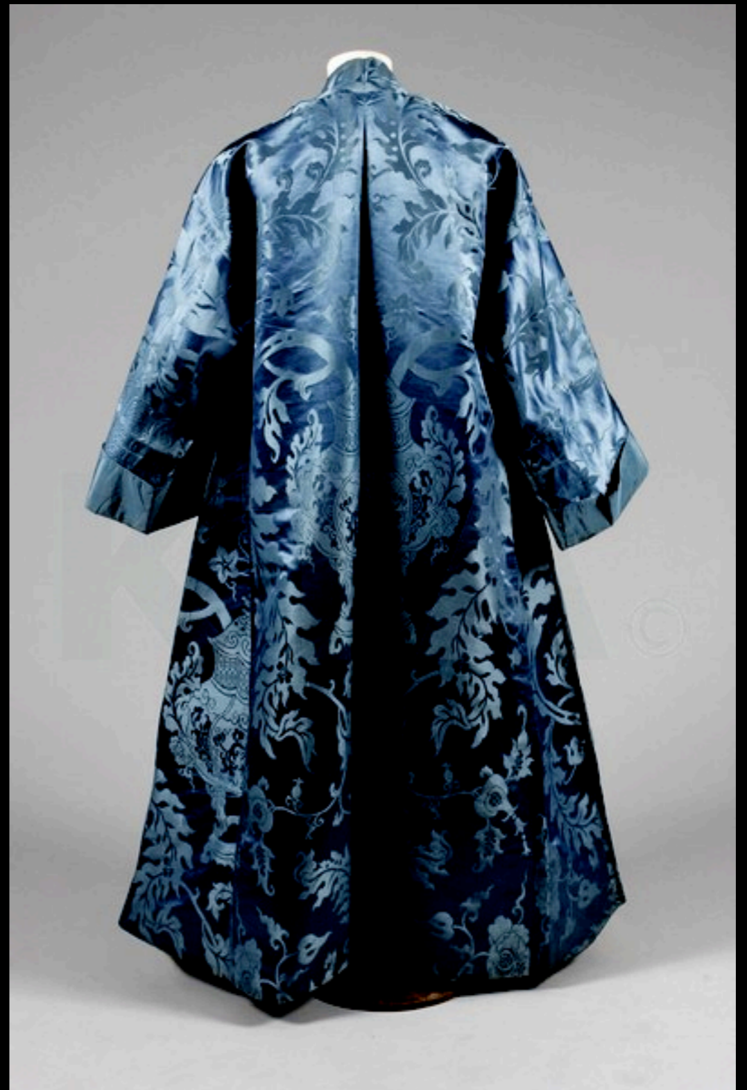
Blue Silk Banyan c. 1740