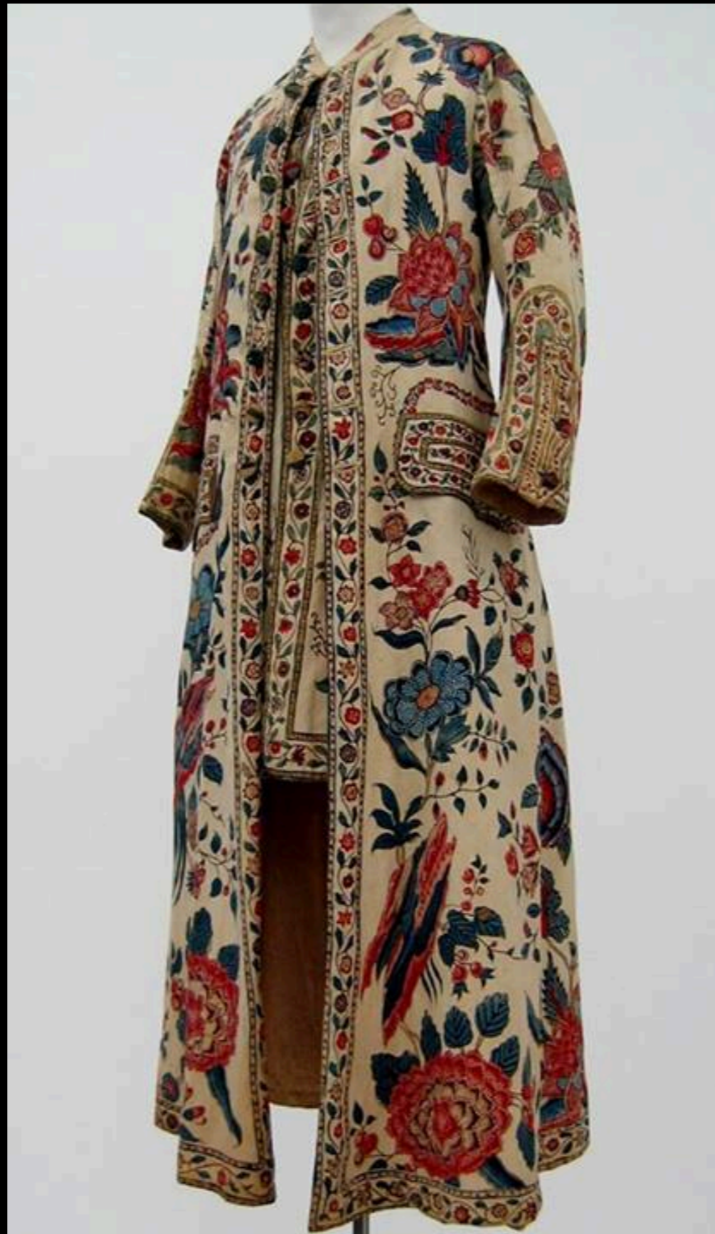
Dutch Chintz Banyan & Waistcoat c. 1750 - 1799 (Centraal Museum in Utrecht, Netherlands.)