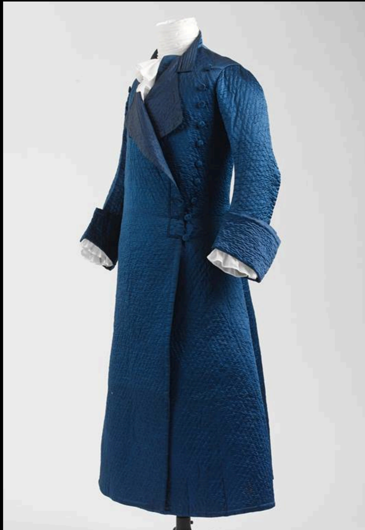
Chinese Trade Silk Banyan c. 1760 (Metropolitan Museum of Art)