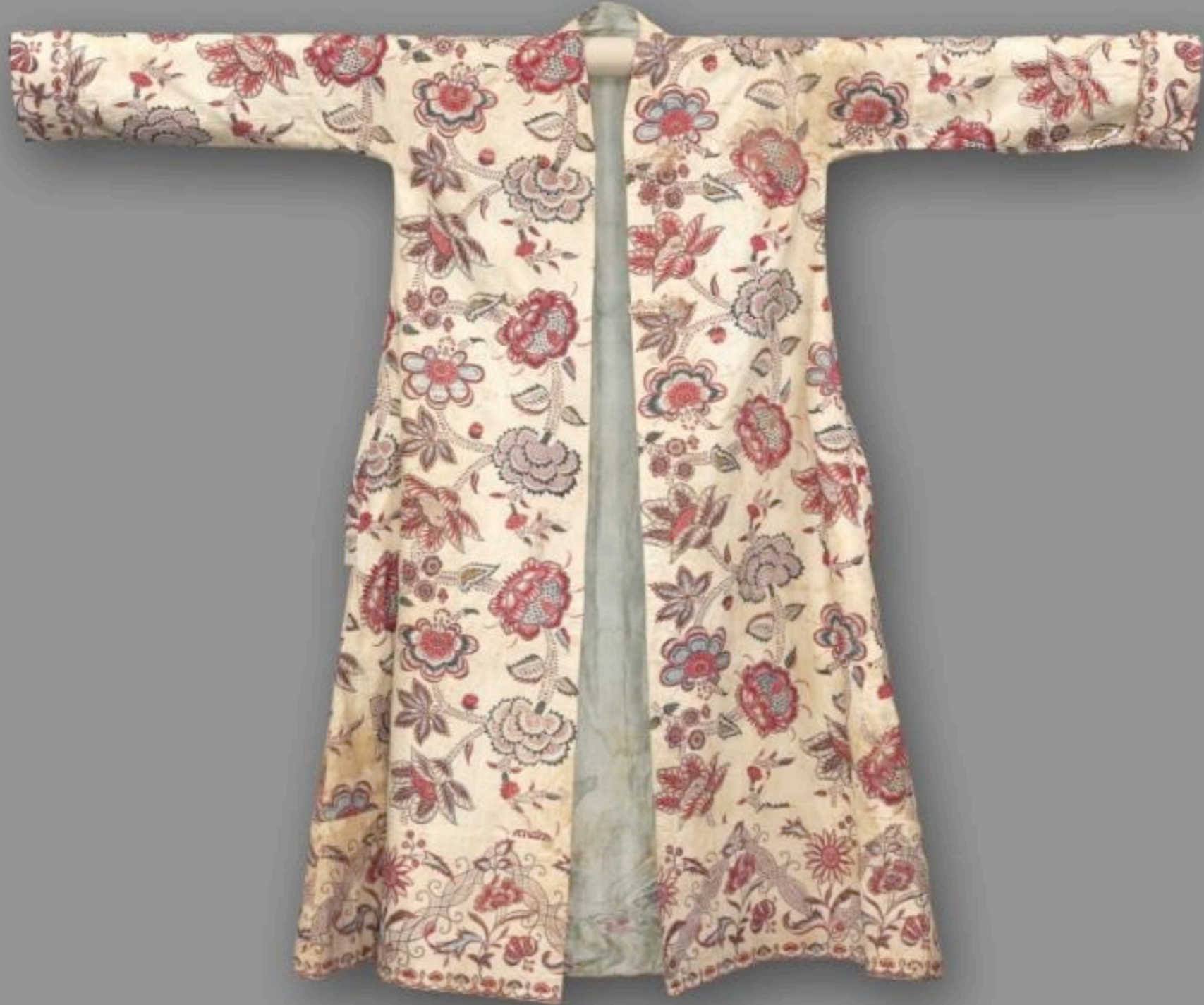
Indian Cotton Banyan 1st Quarter 18th Century (Cleveland Museum of Art)