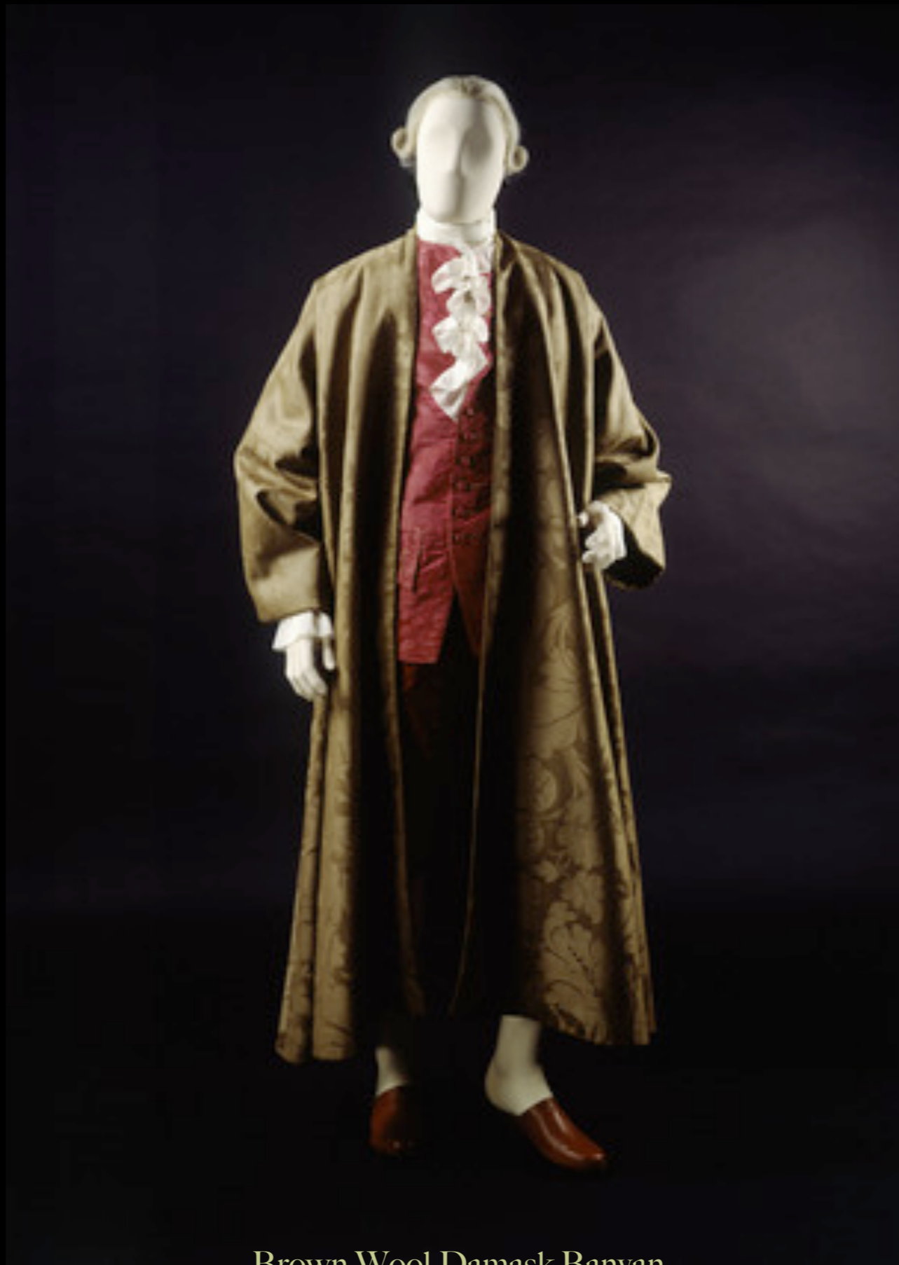
Brown Wool Damask Banyan