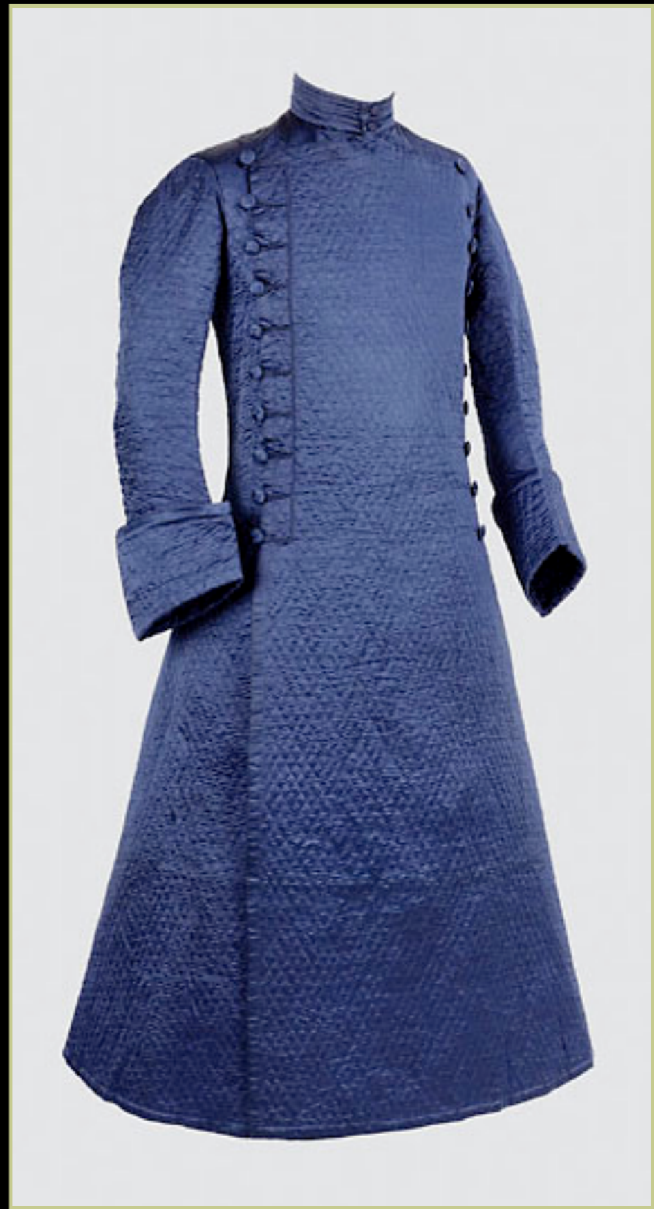
Chinese Trade Silk Banyan c. 1760 (Metropolitan Museum of Art)