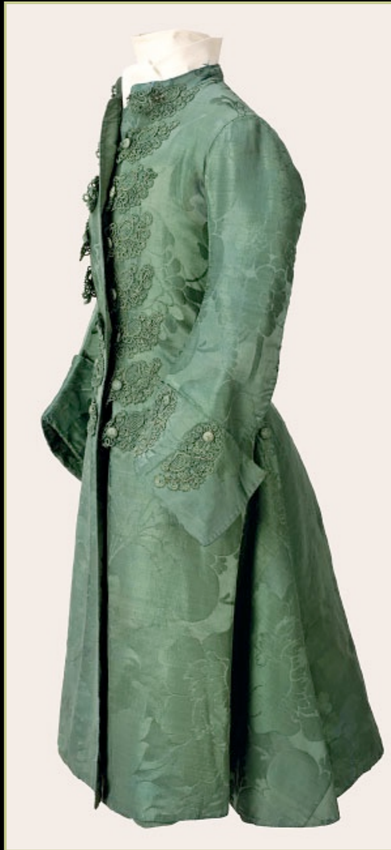
English Silk Satin Damask Banyan