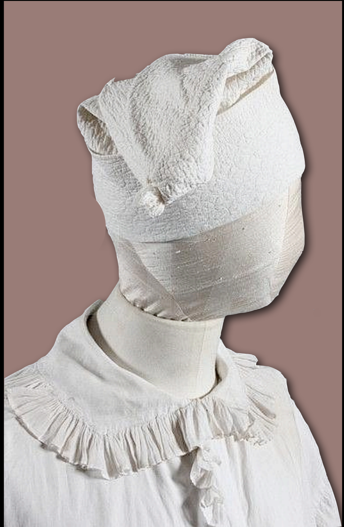
Linen Night Shirt with Dorset Buttons - Cotton Night Cap 18th Century (RIJKS Museum)