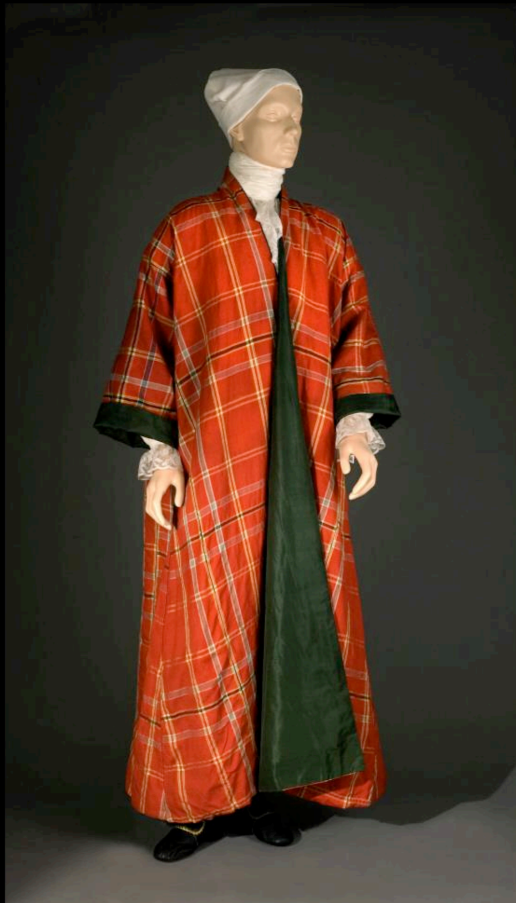
Great Britain Tartan or Plaid Gown c. 1770 - 1800 (Colonial Williamsburg)