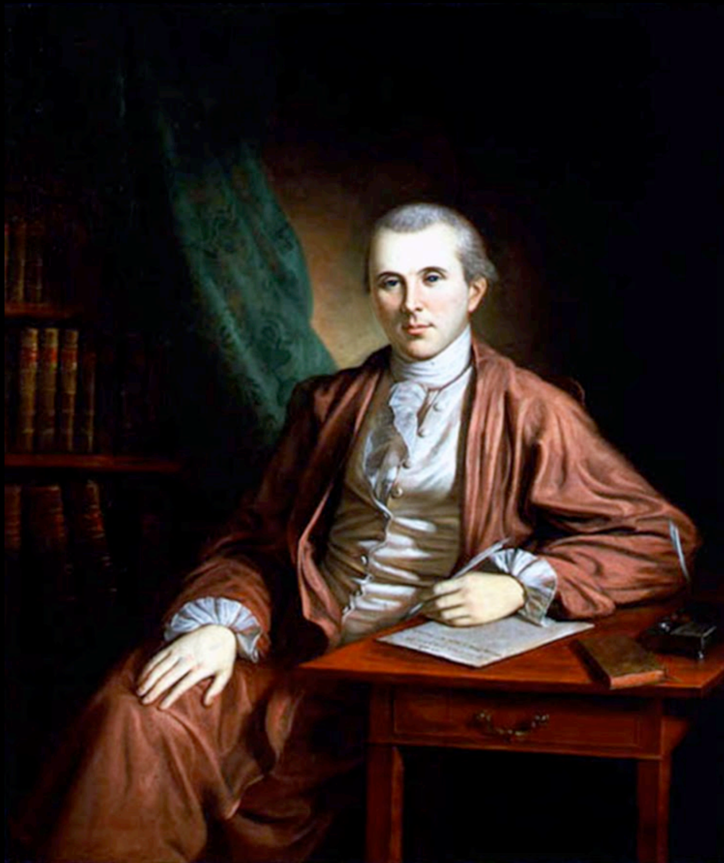
Nicholas Boylston of Boston by John Singleton Copley c. 1767