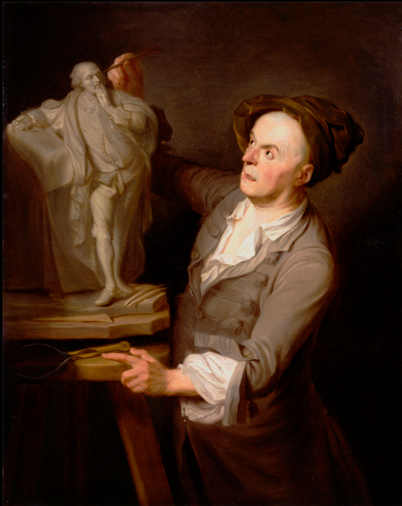
Louis-Francois Roubiliac Modelling by Adrien Carpentiers 1761 (Yale Center for British Art)