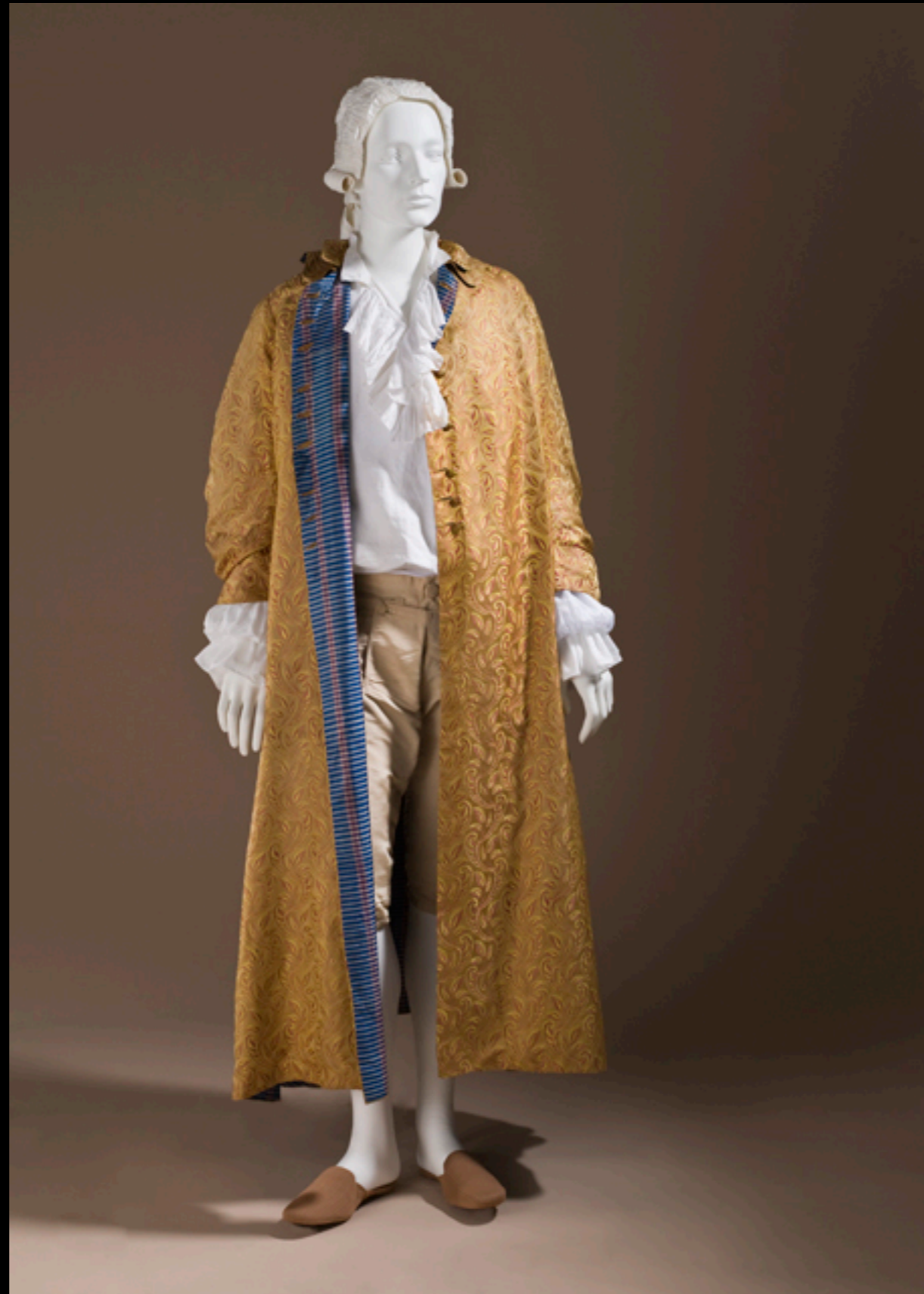
French Silk Banyan c. 1760 (Los Angeles County Museum of Art)