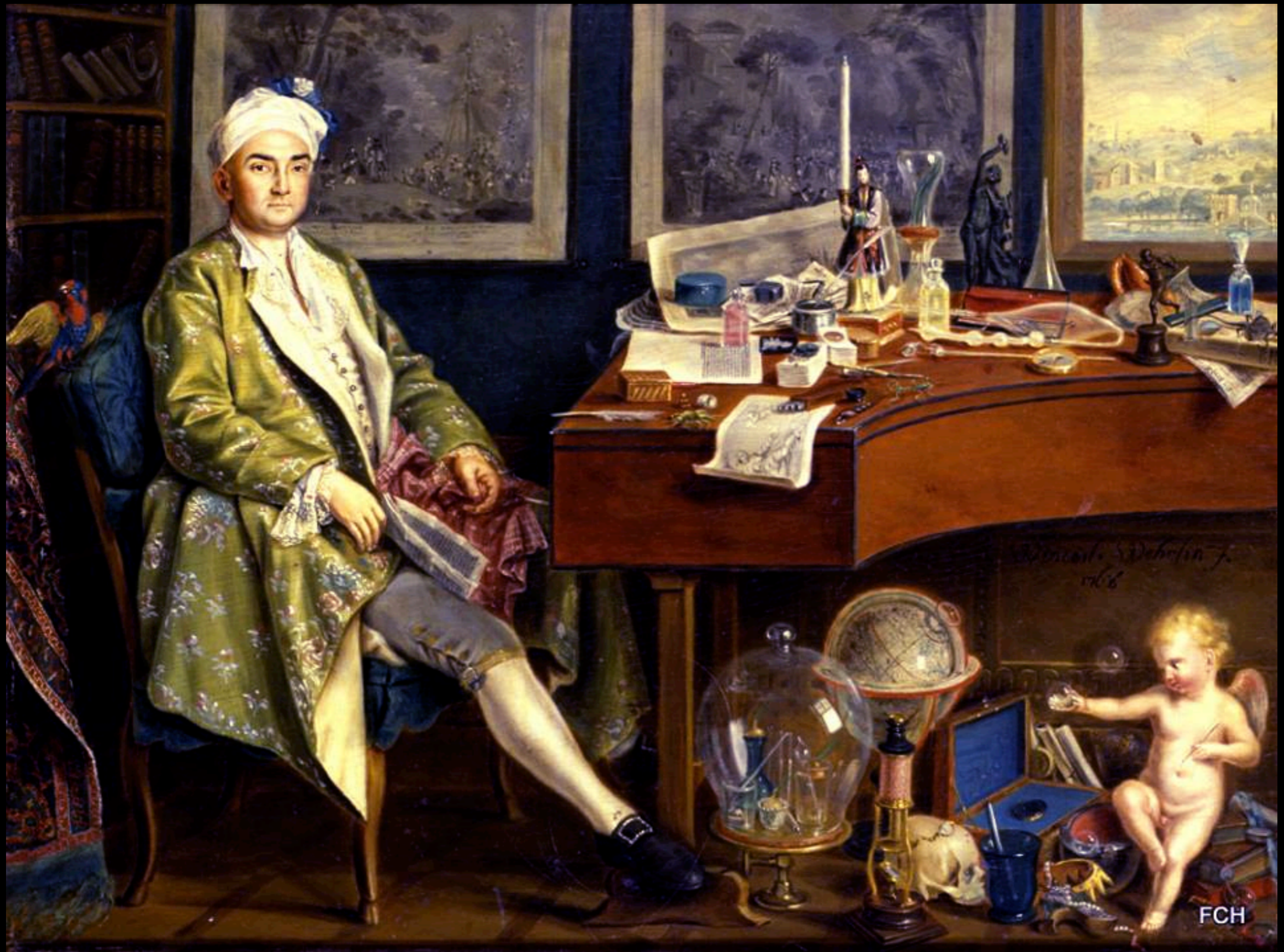
A Collector in his Study by Wenzel Wehrin c. Mid 18th Century (Wimpole Hall © National Trust Images)