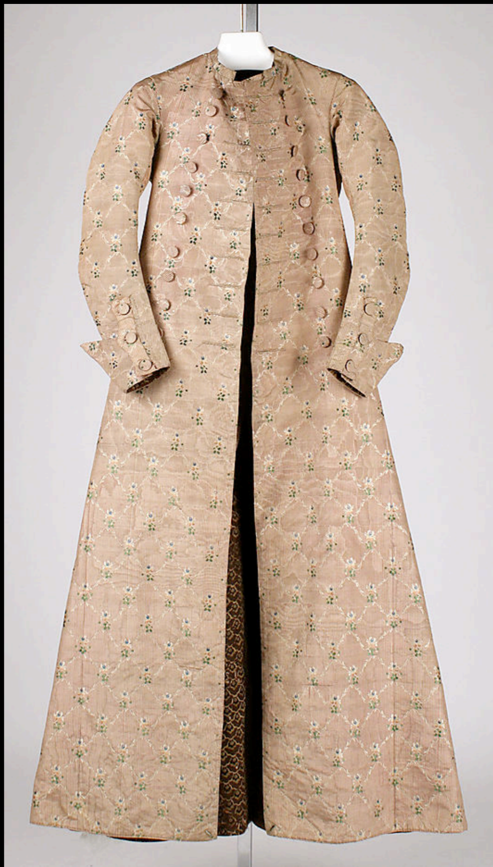
French Silk & Linen Banyan c. 1760 (Metropolitan Museum of Art)