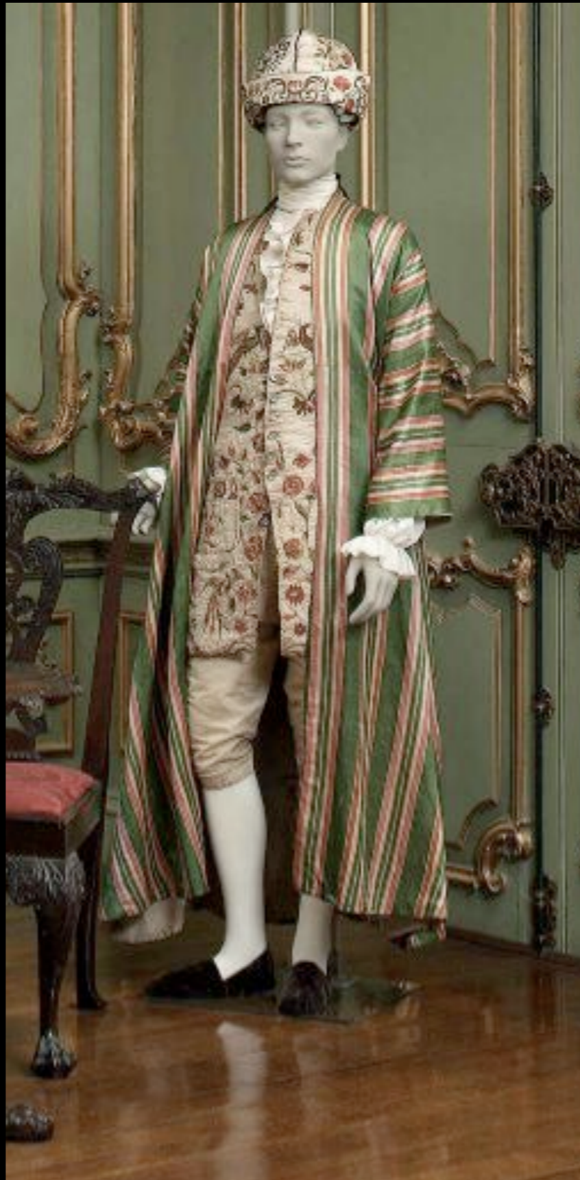
Striped Silk Banyan