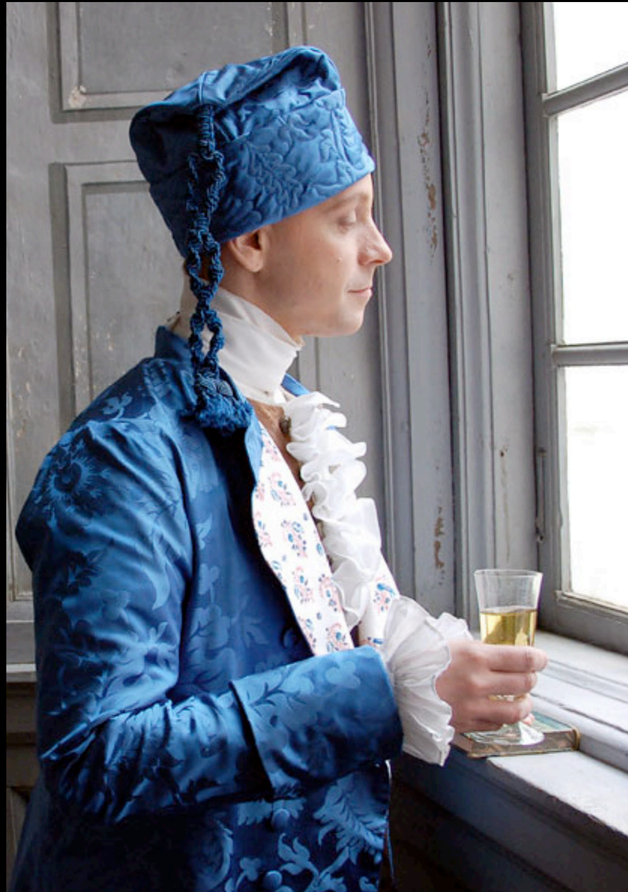
A Banyan and Cap Recreated