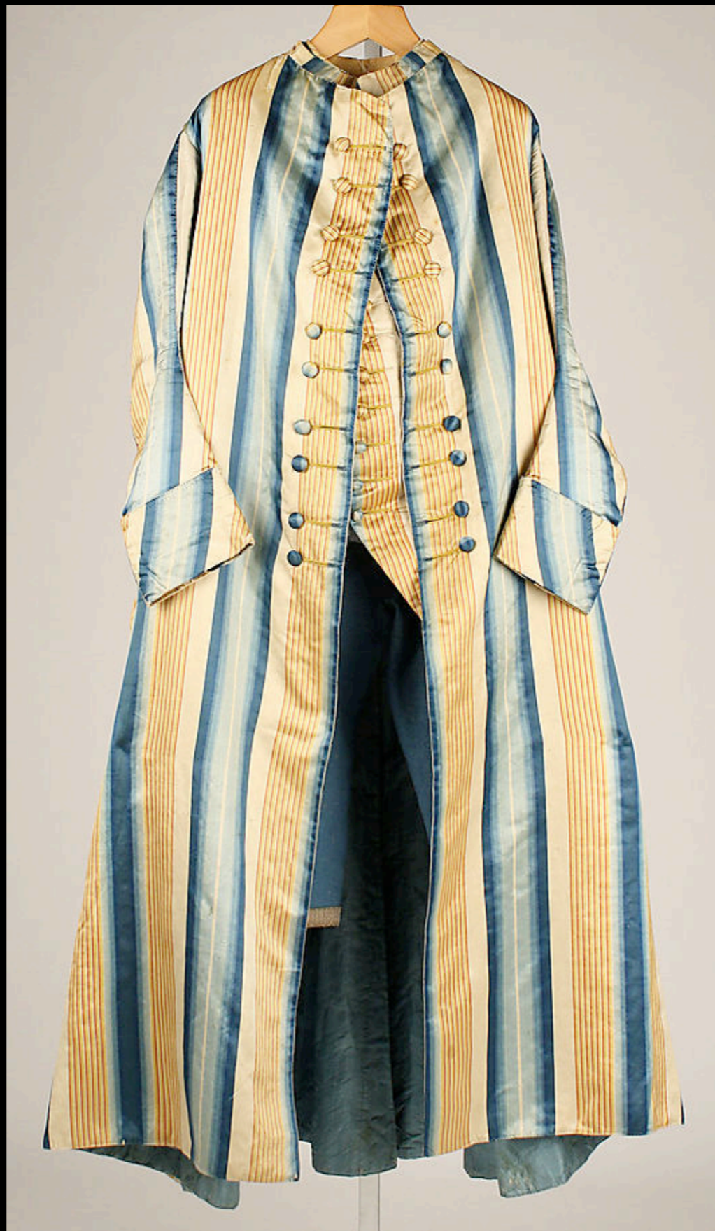
European Silk Banyan 2nd Half 18th Century (Metropolitan Museum of Art)