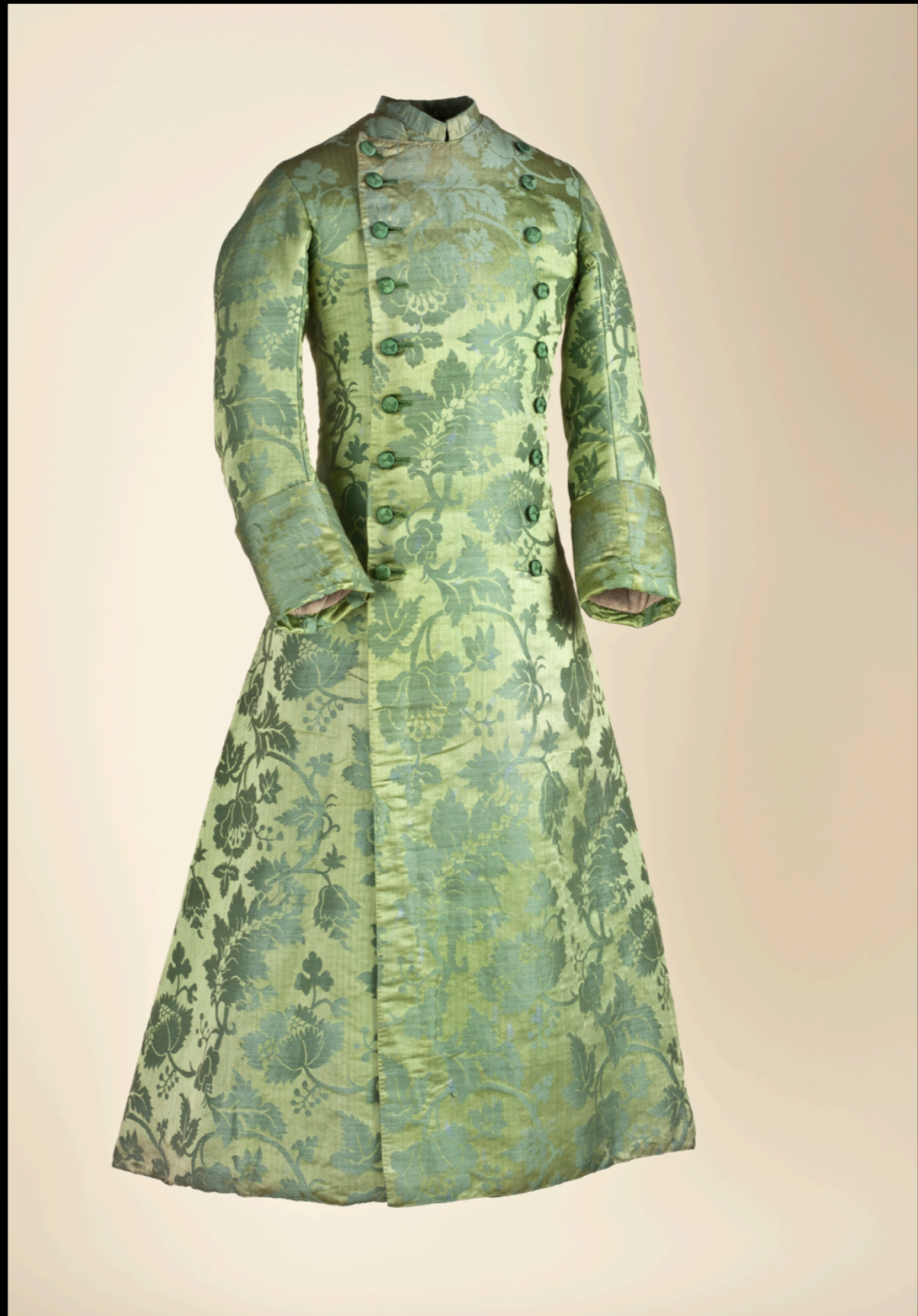
China Trade Silk Banyan c. 1750 - 1760 (Los Angeles County Museum of Art)