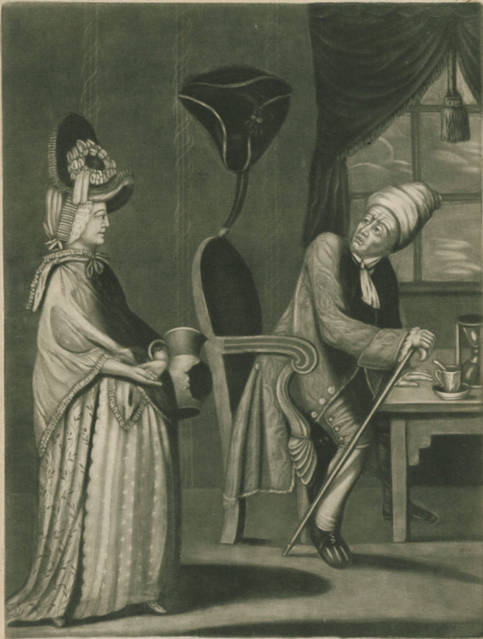
You've Crack'd my PIPKIN Sr: said she so MARRY me & Mend it