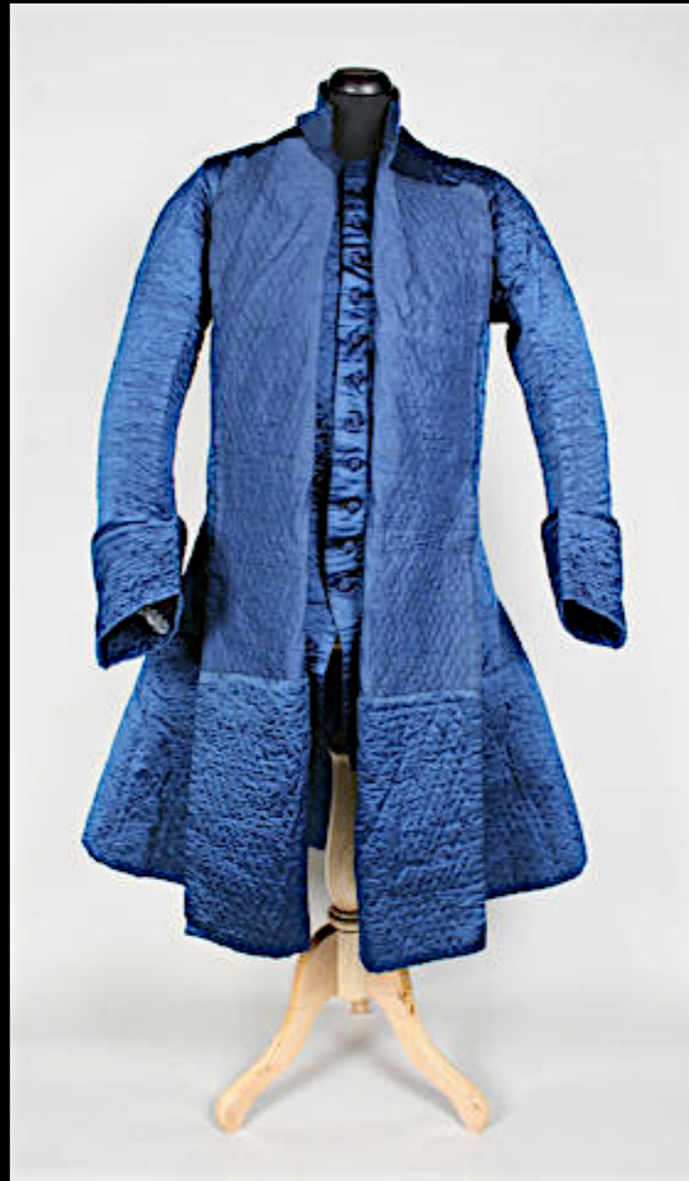
Chinese Trade Silk Banyan c. 1760 (Bonhams)