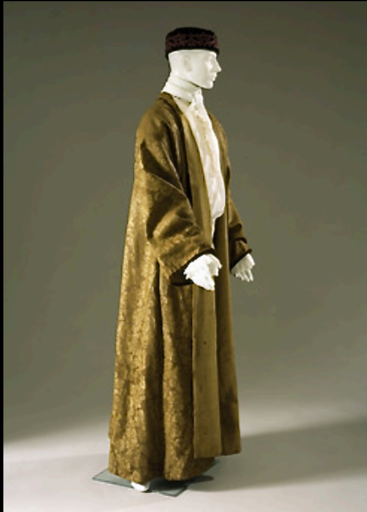
Brown Wool Damask Banyan Lined with Light Brown Twill, Trimmed in Velvet c. 1740 - 1760