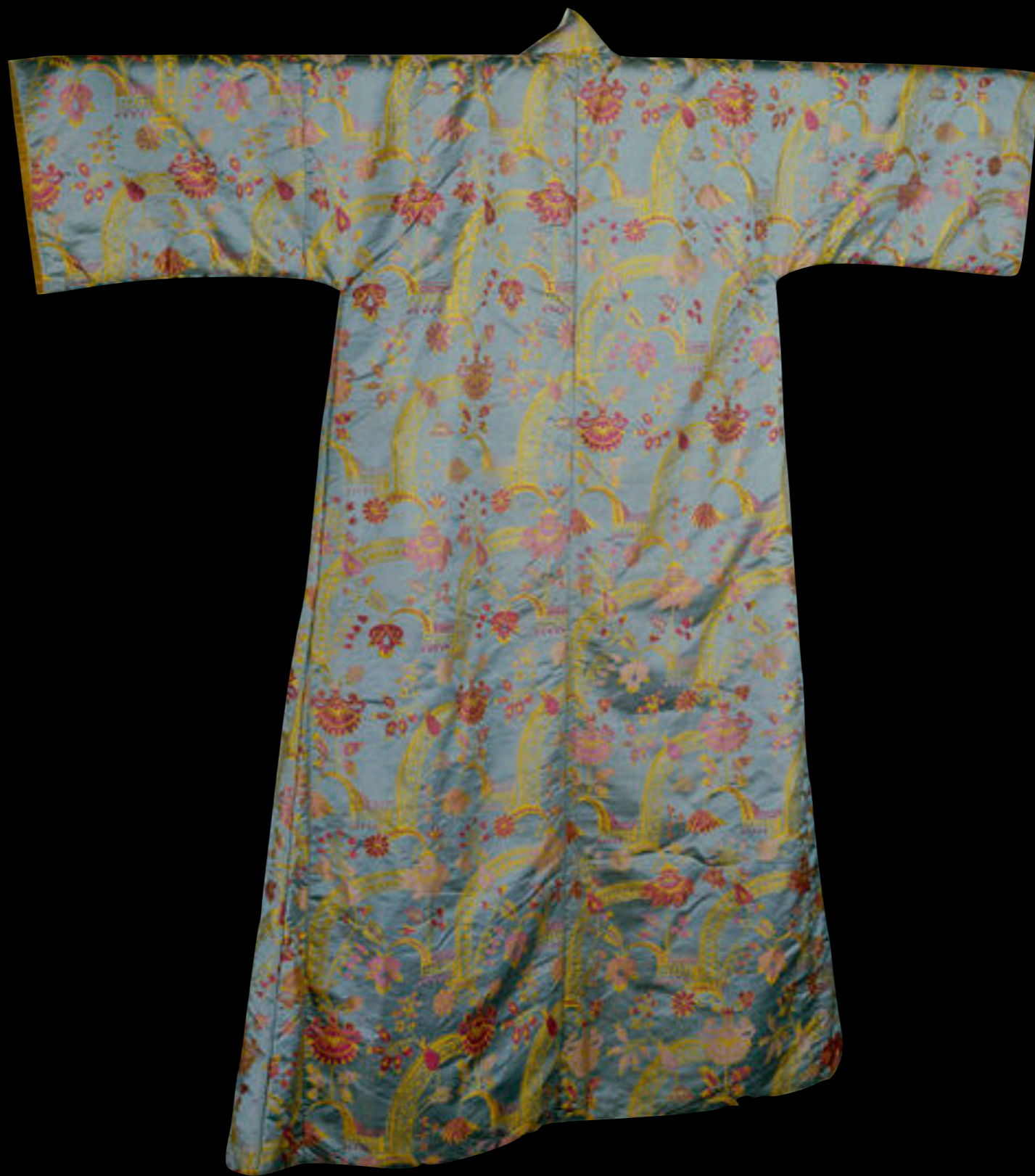
Spitalfields England Silk Night Gown