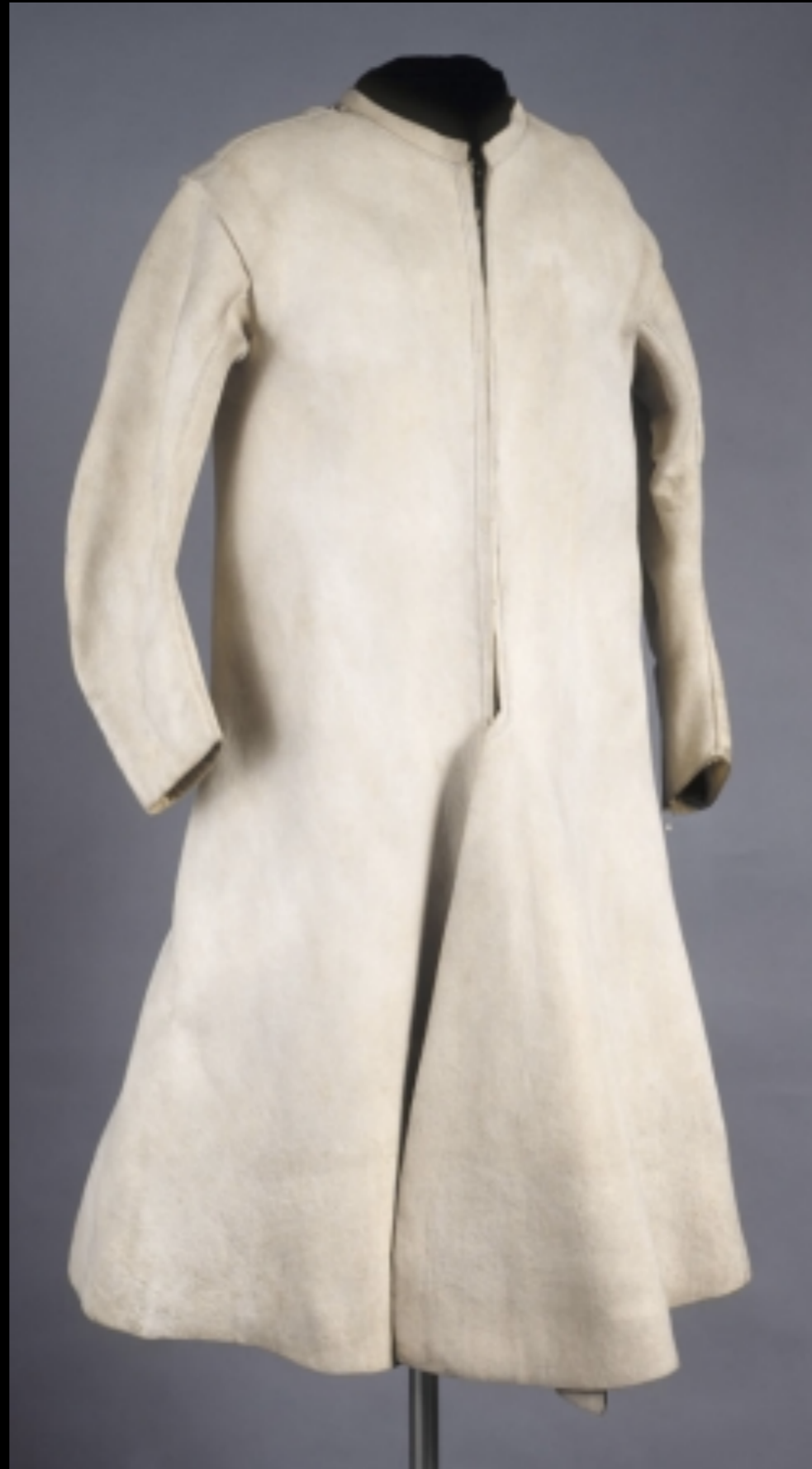
Banyan Dressing Gown