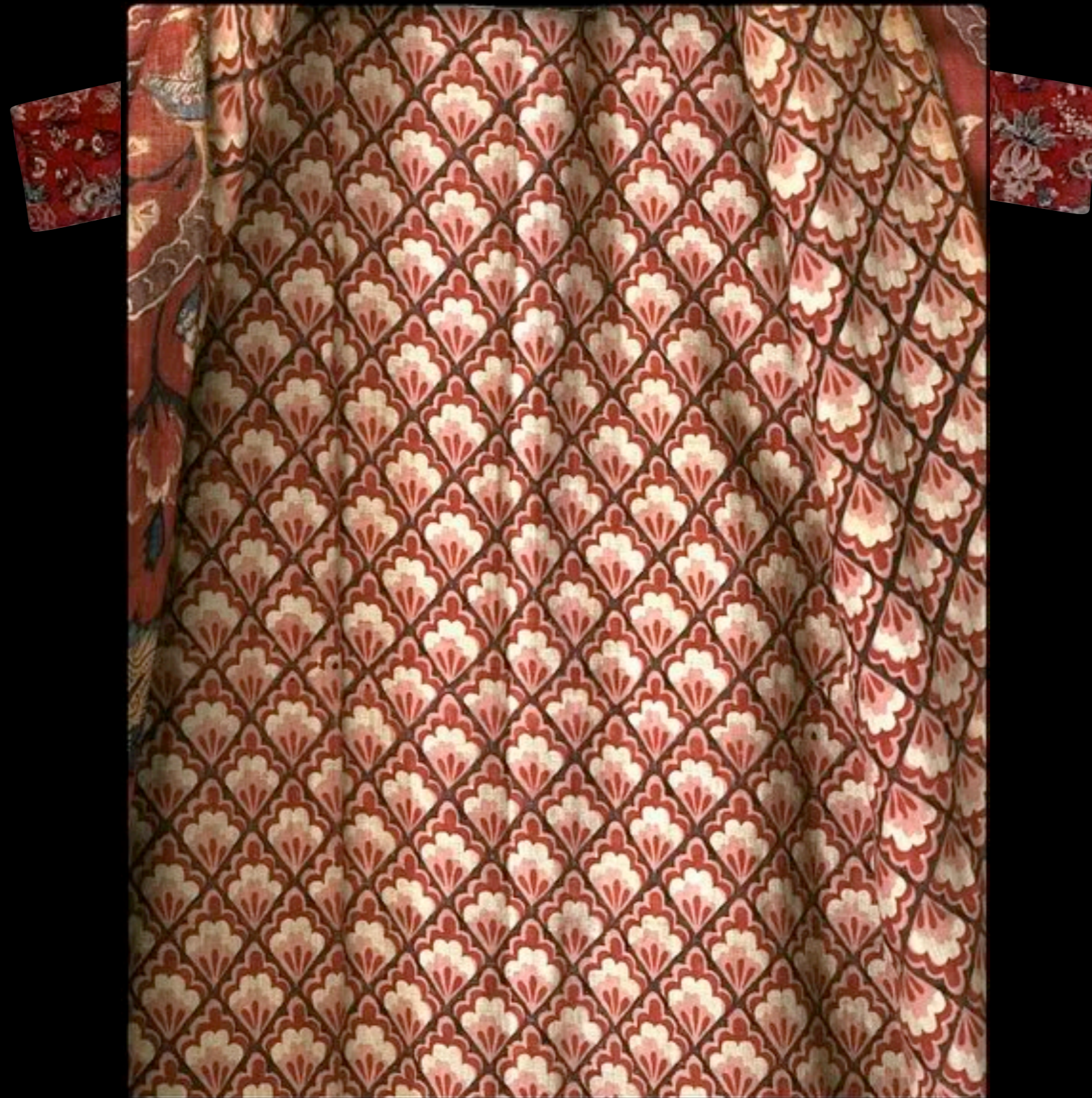
Banyan of Indian Cloth Lined with European Calico