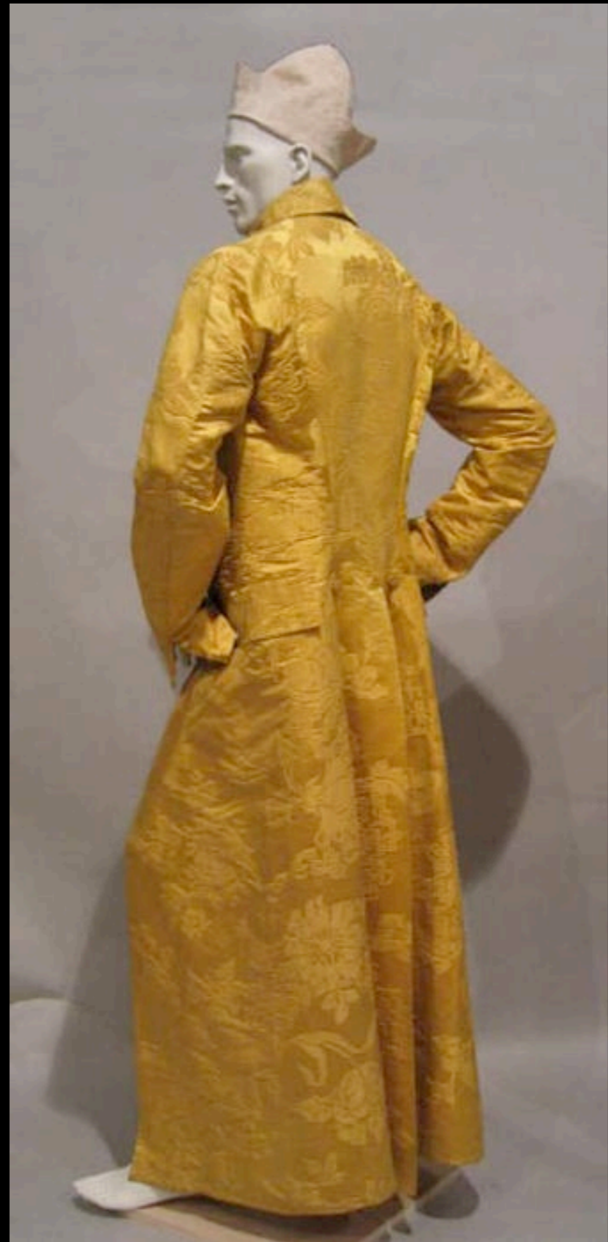
British Silk Banyan c. 1780 (Metropolitan Museum of Art)