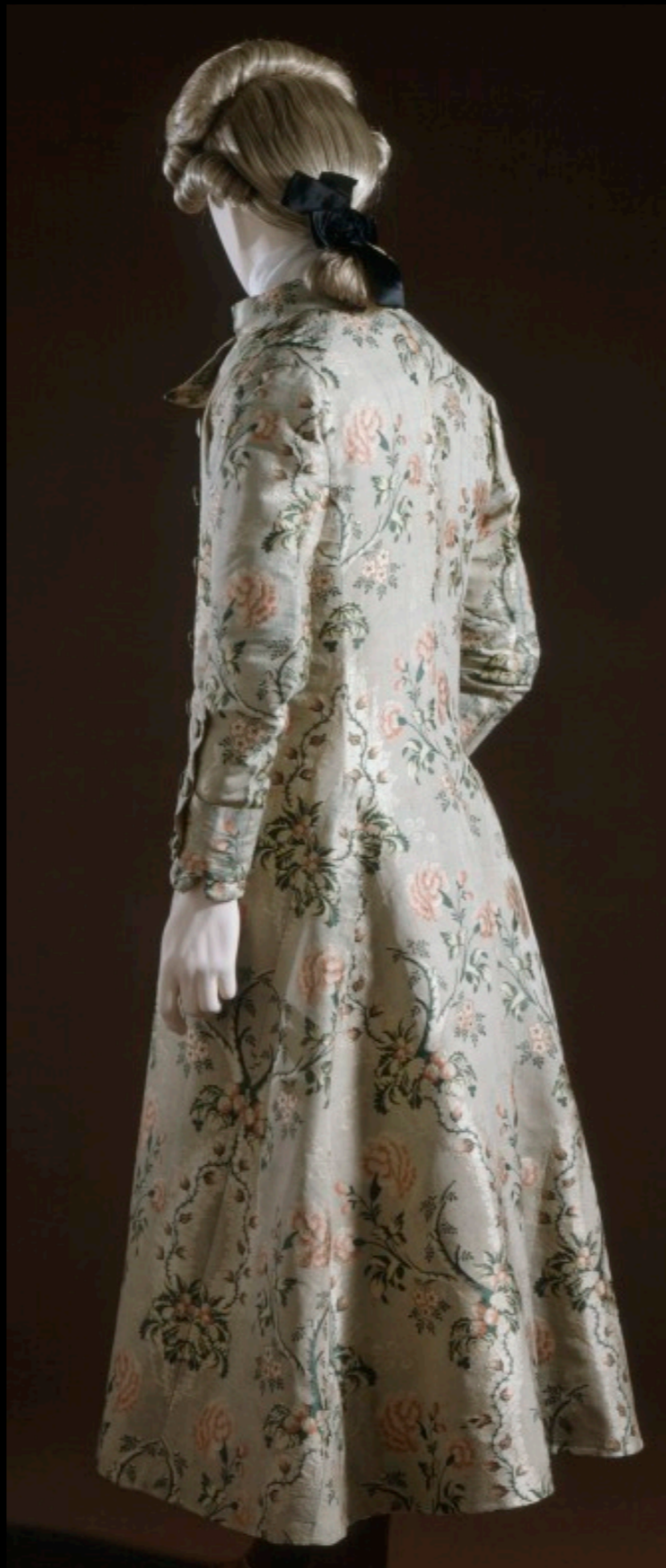
French Silk Banyan c. 1765