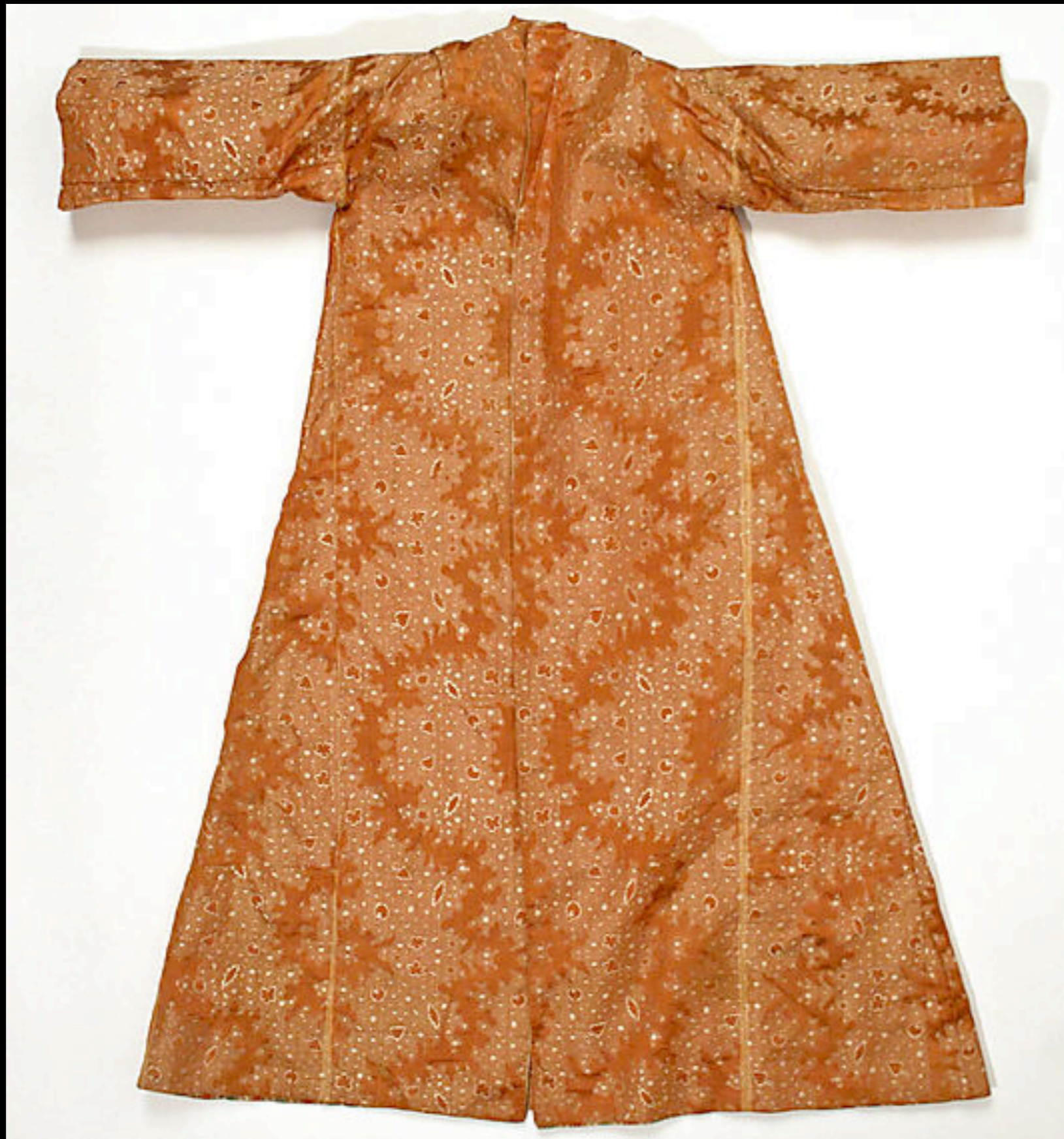
English Silk Banyan: 1st Quarter 18th Century (Metropolitan Museum of Art)