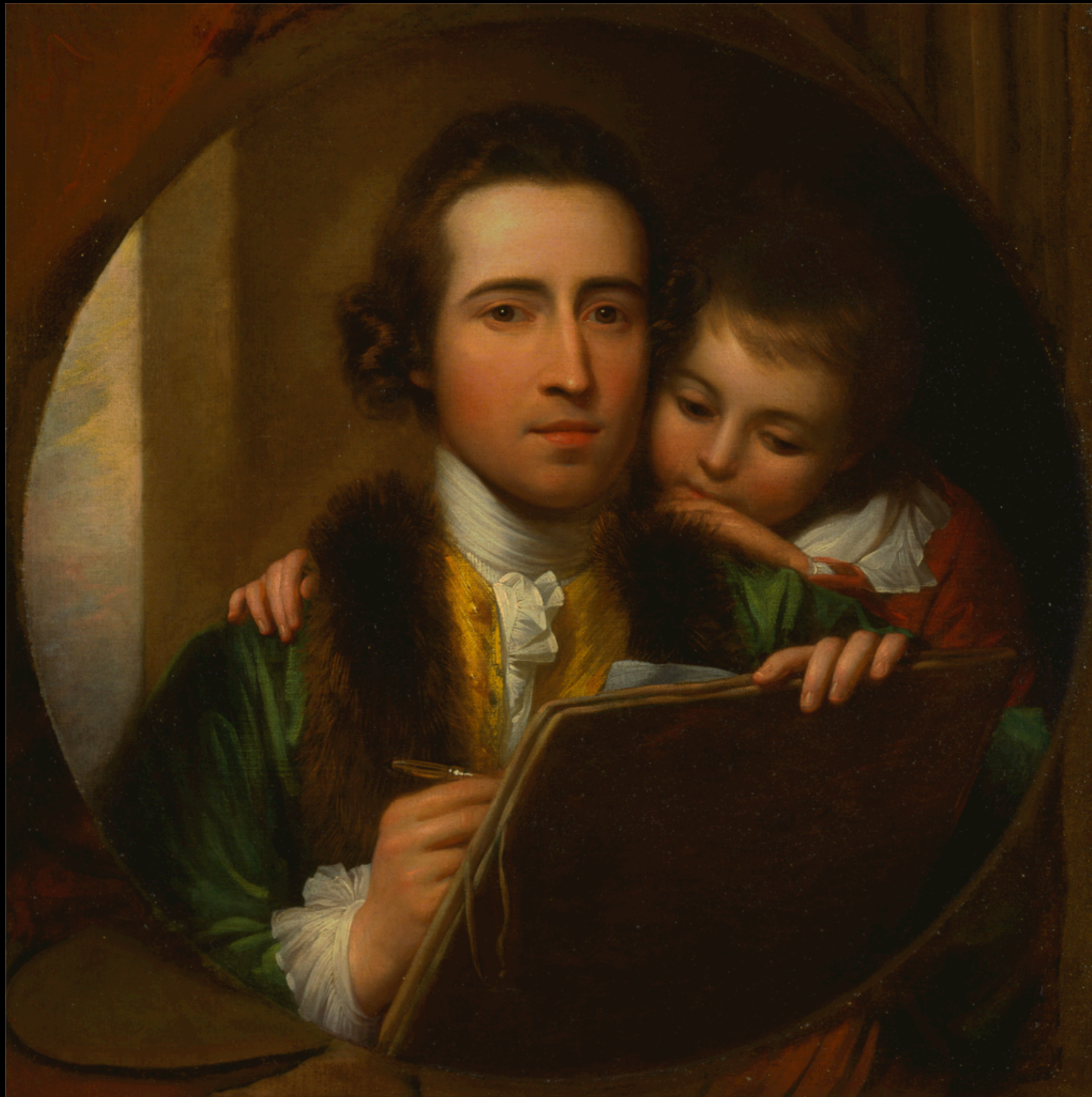
Benjamin West & His Son, Raphael by Benjamin West 1773 (Yale Center for British Art)