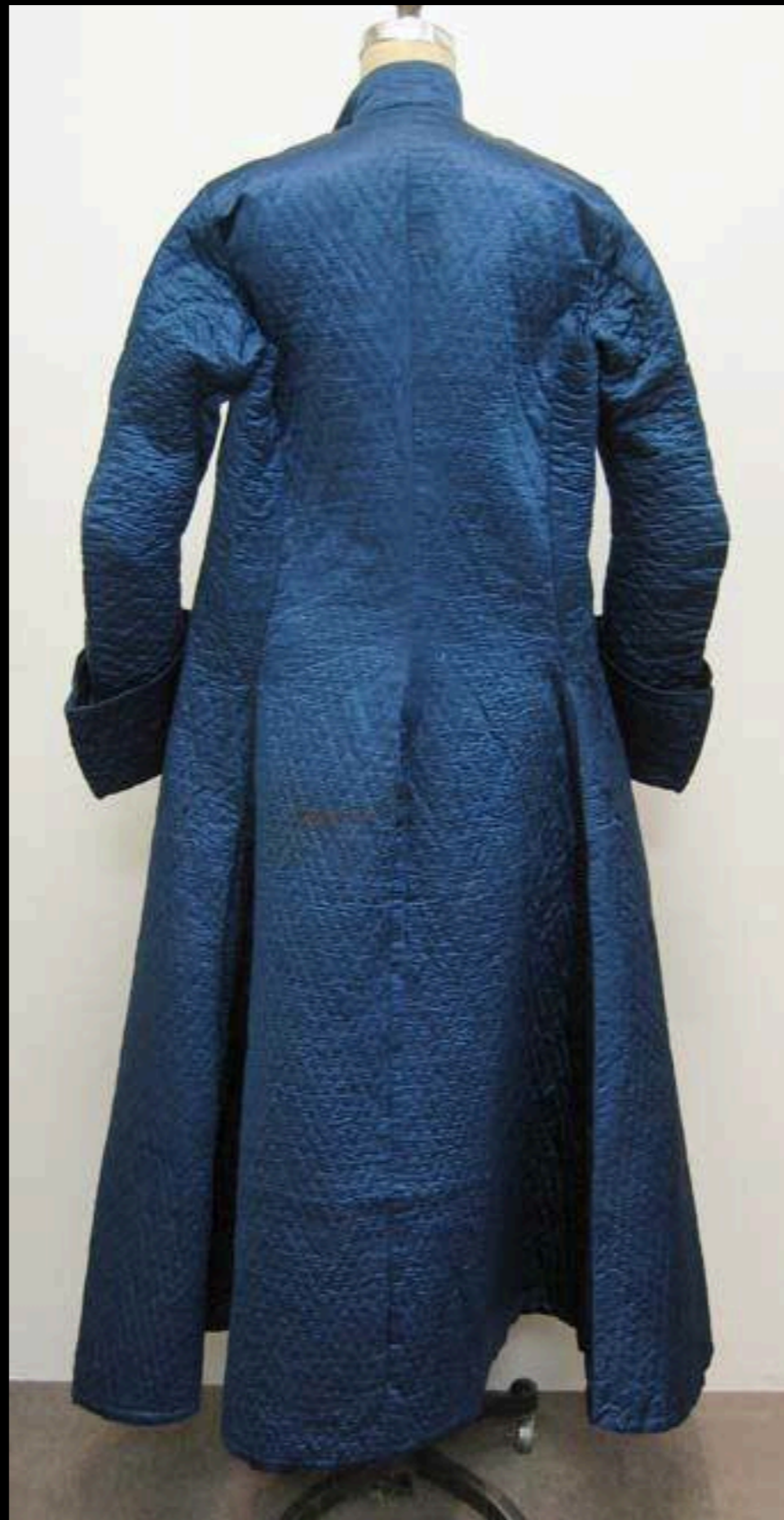
Chinese Trade Silk Banyan c. 1760 (Metropolitan Museum of Art)