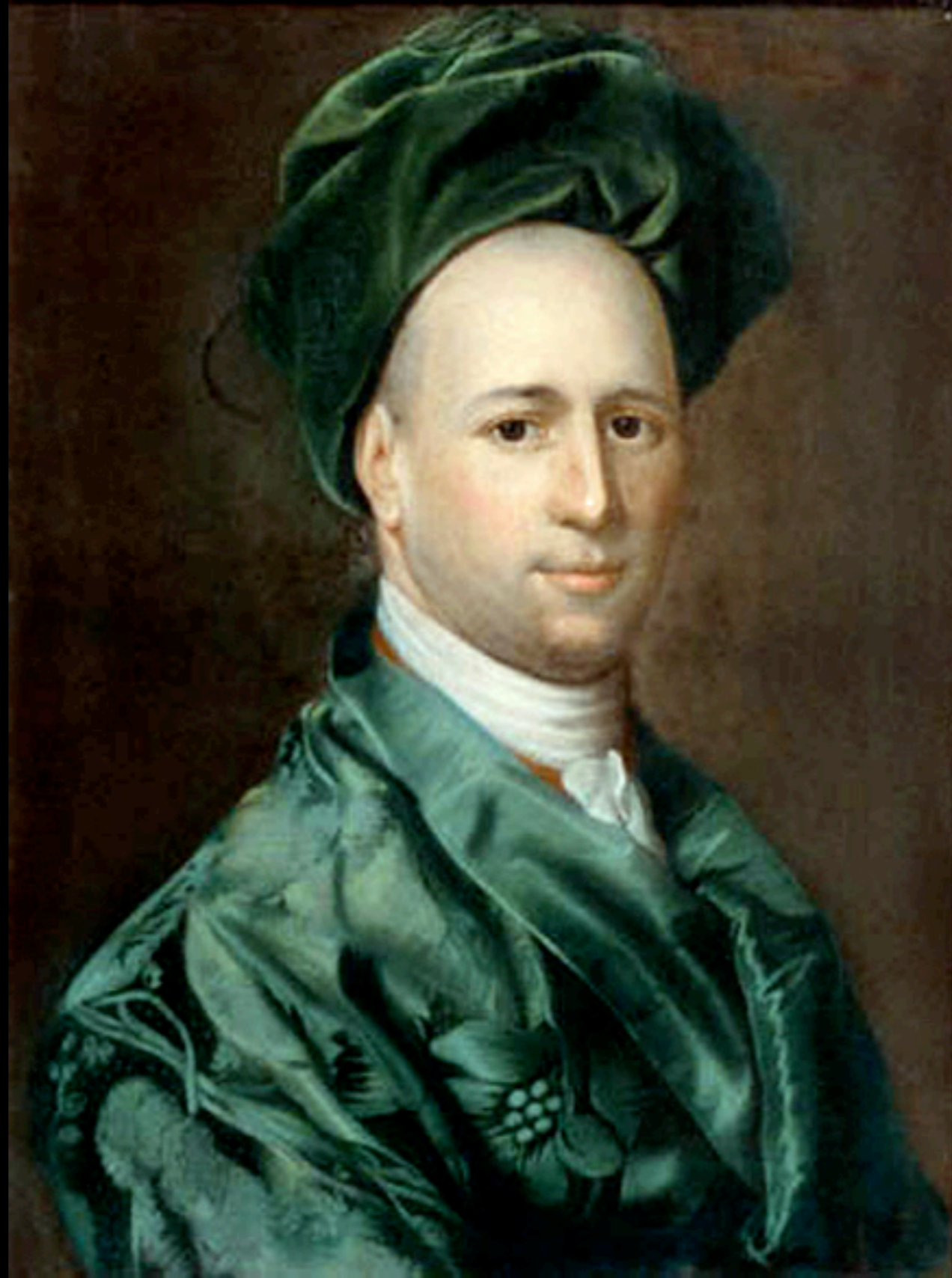
Ebenezer Storer of Boston by John Singleton Copley c. 1767 - 1769