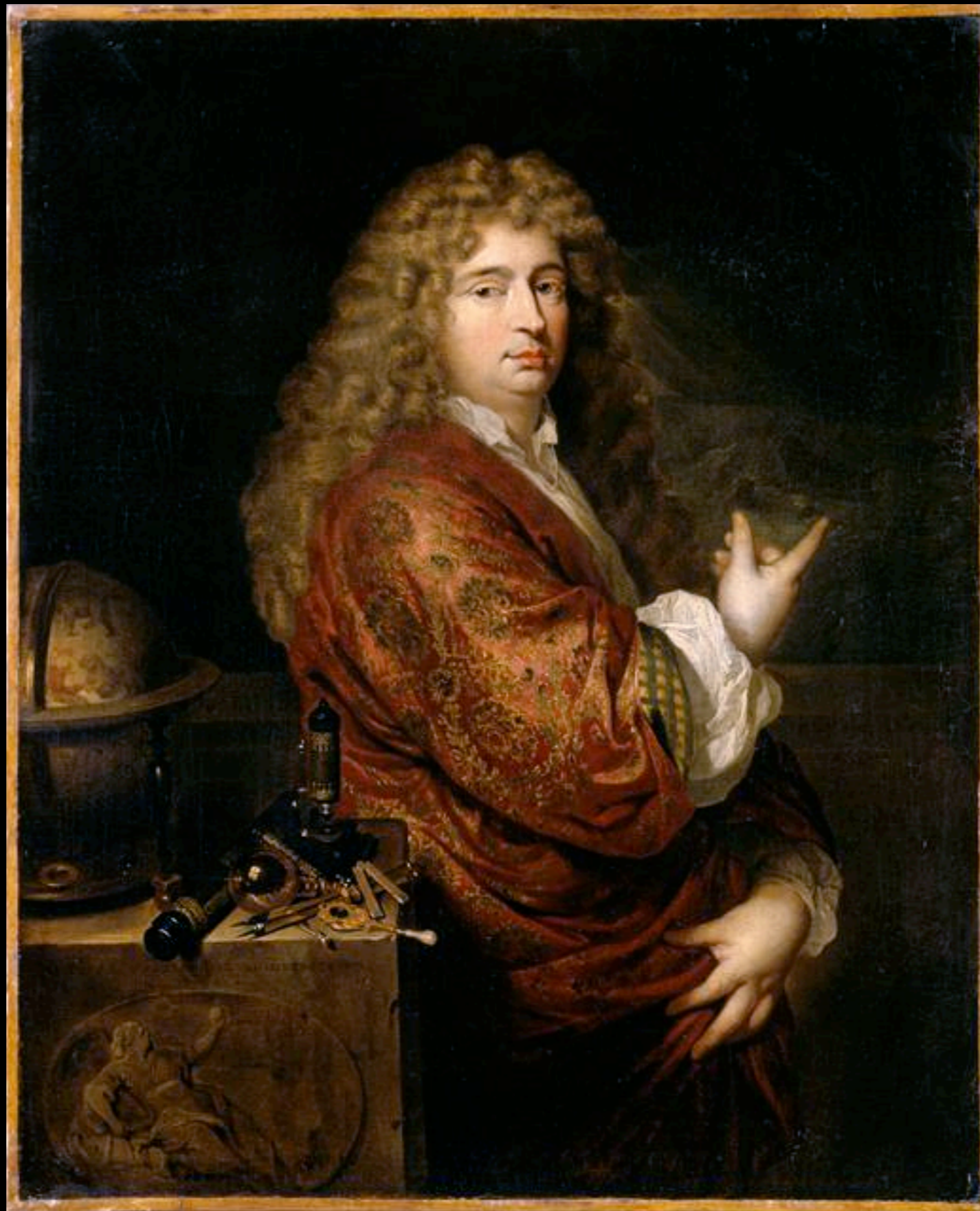
Nicolaes Hartsoeker by Caspar Netscher c. Late 17th century (Yale Center for British Art)