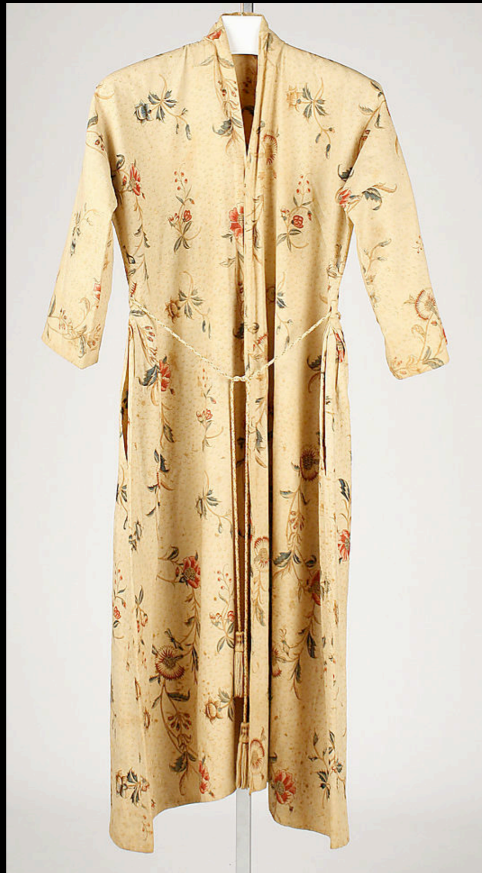
American Cotton & Linen Banyan c. 1725 - 1780 (Metropolitan Museum of Art)