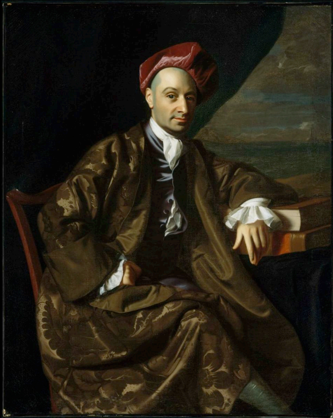
Boston Merchant Nicholas Boylston by John Singleton Copley c. 1769 (Museum of Fine Arts, Boston)