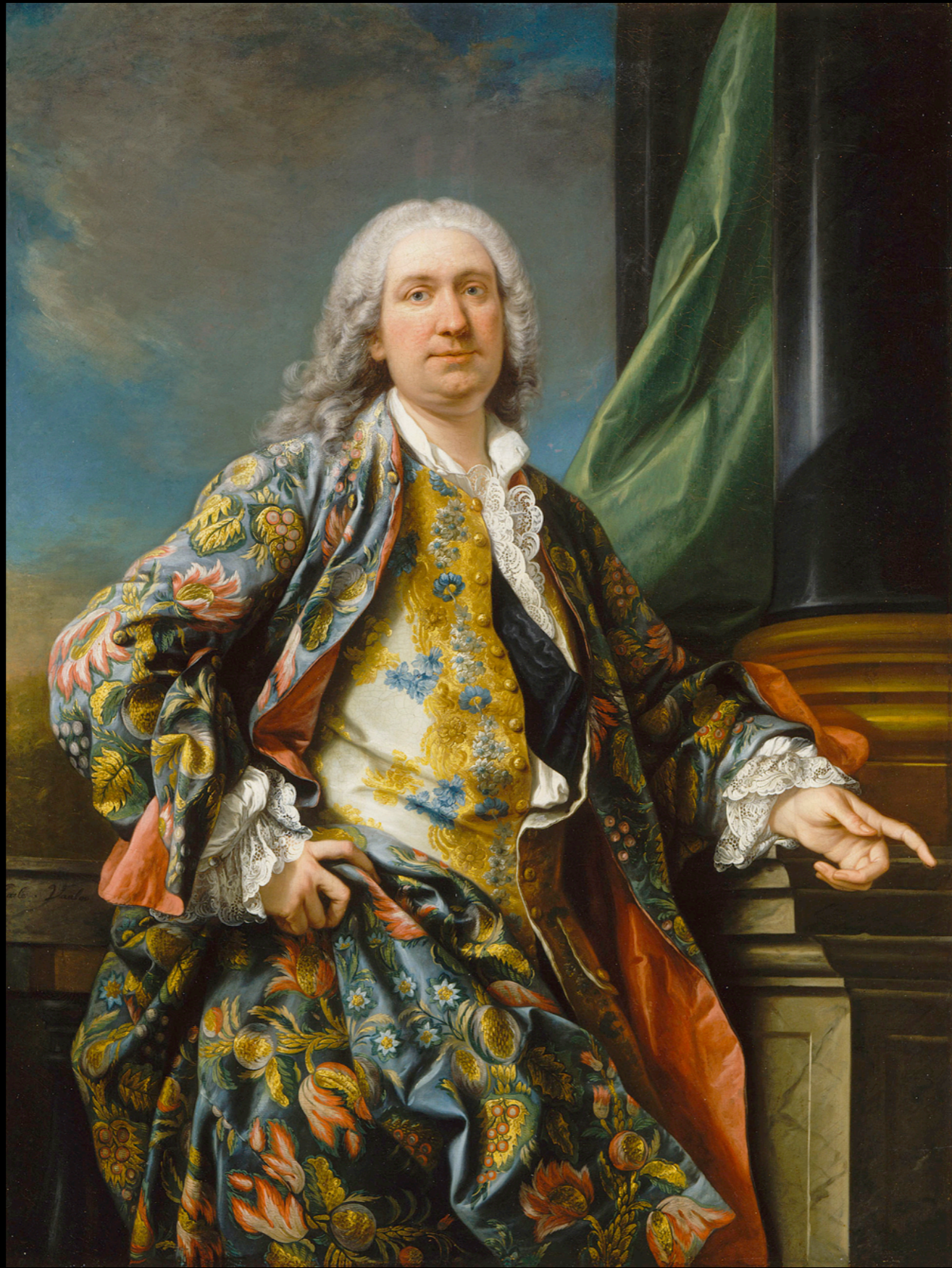
Portrait of an Unknown Frenchman by Carle Van Loo c. 1730 - 1740