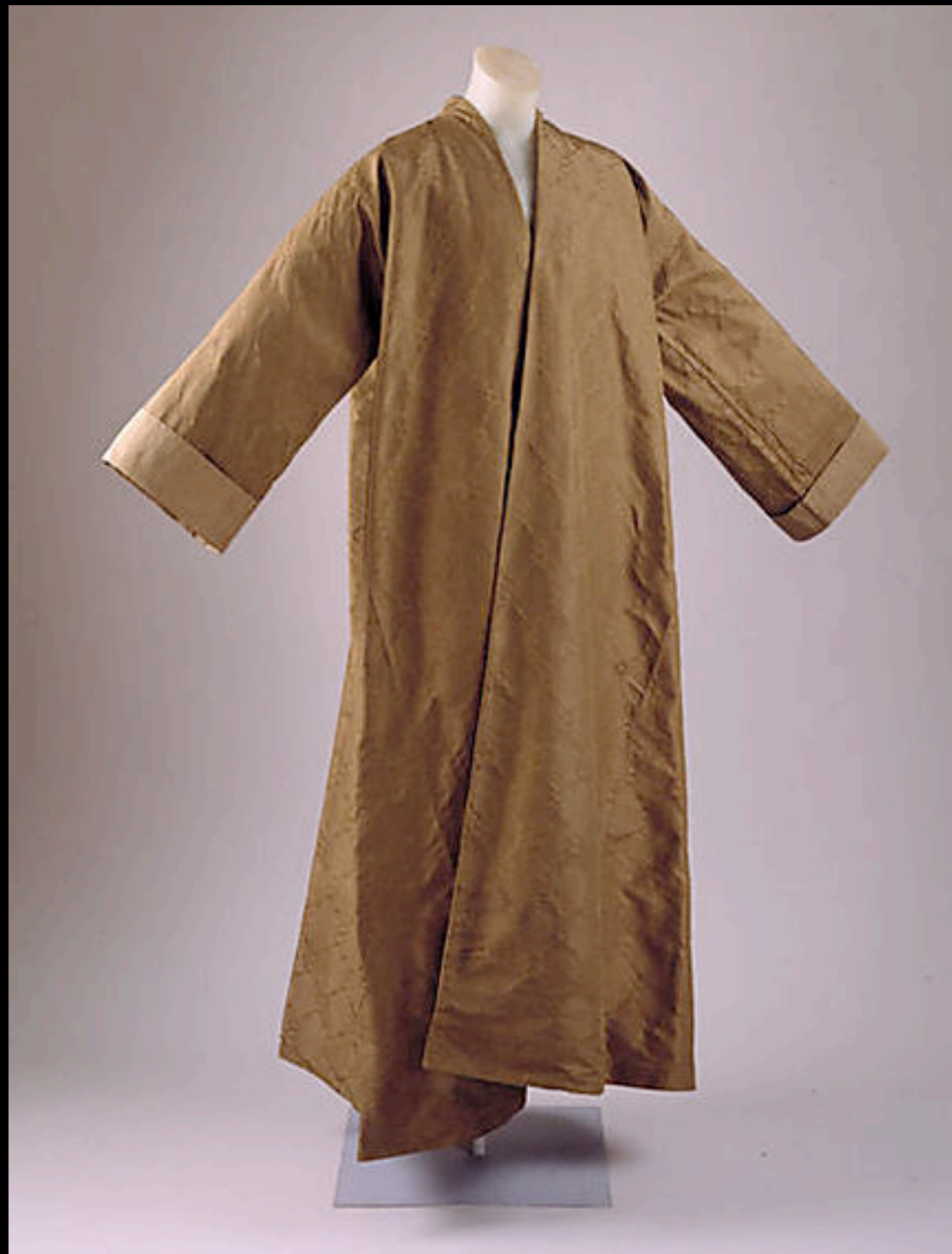
English Silk Banyan c. 1735 - 1740 (Metropolitan Museum of Art)