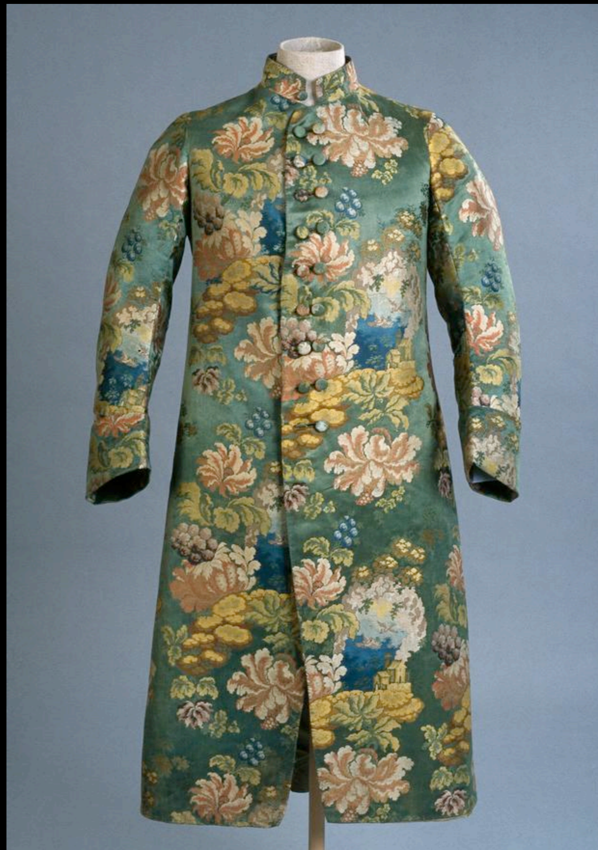
French Silk Banyan c. 1780 (Royal Ontario Museum, Toronto)