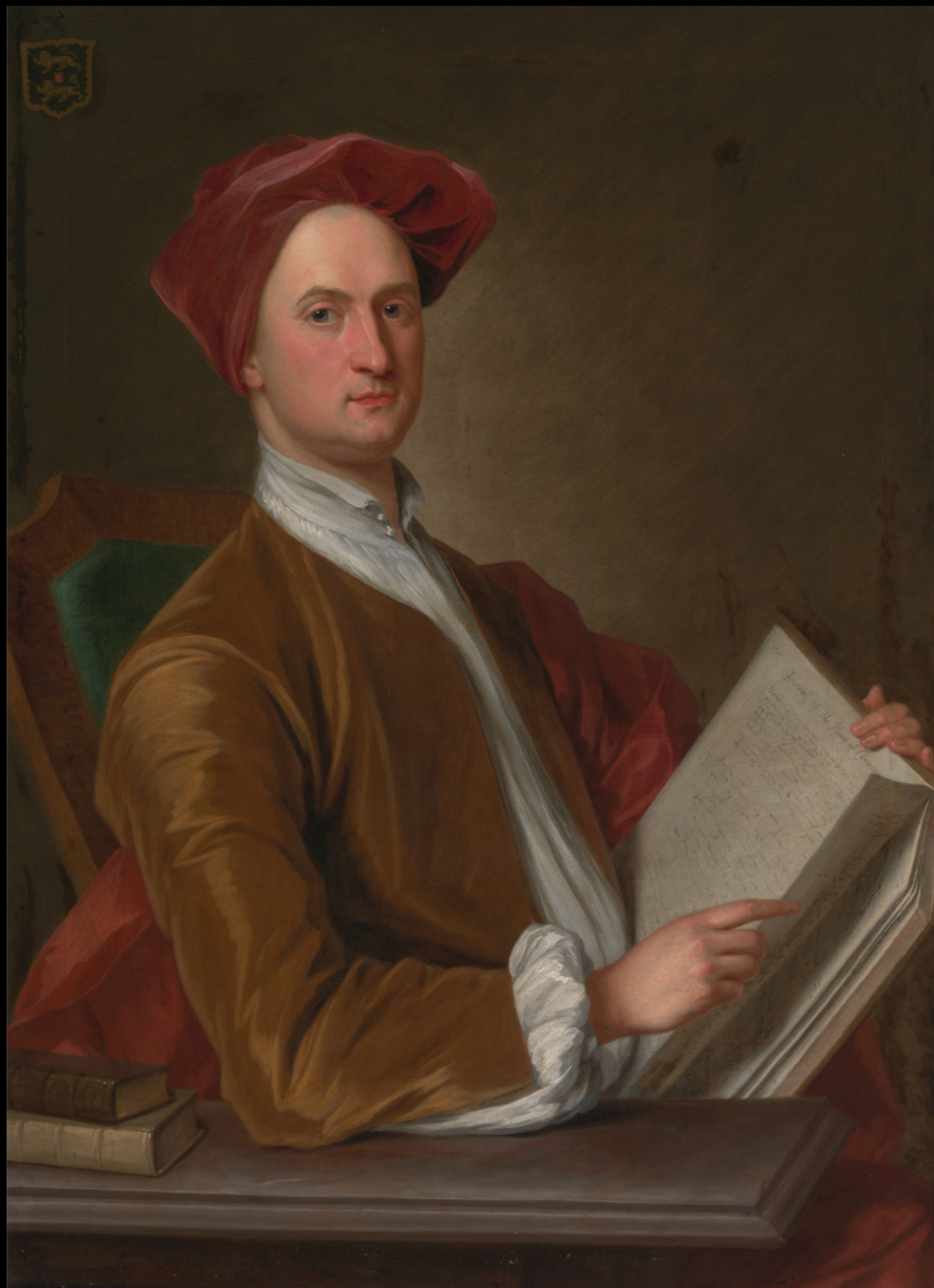
Sir John Rushout by John Smibert (English, Active in America) c. 1726 (Yale Center for British Art)