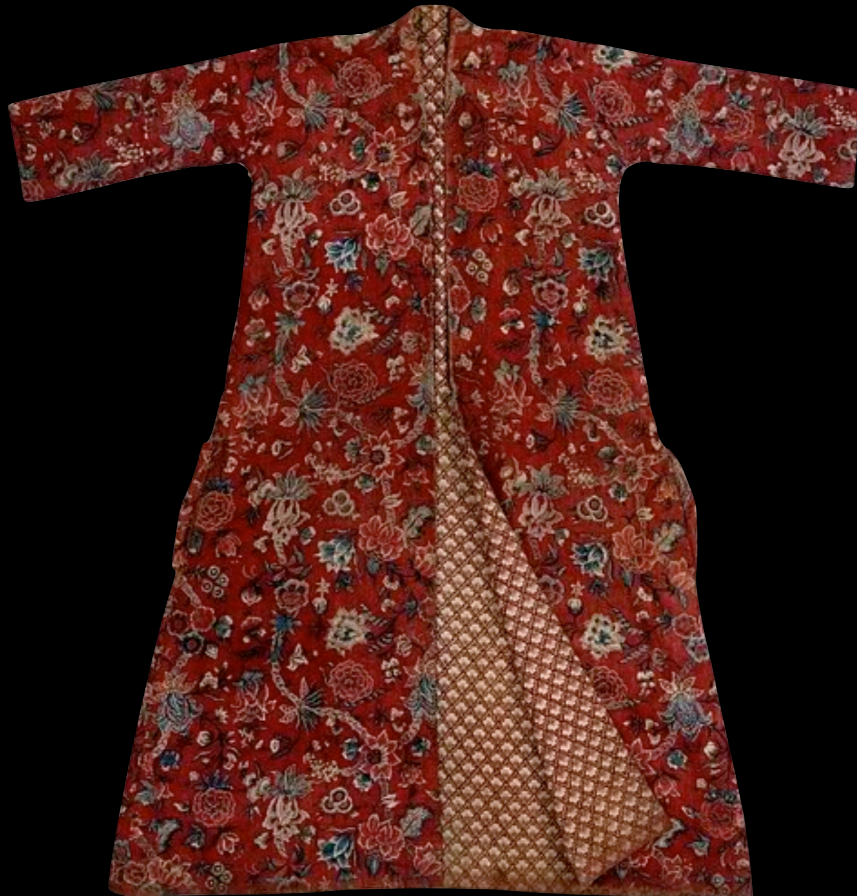
Banyan of Indian Cloth Lined with European Calico