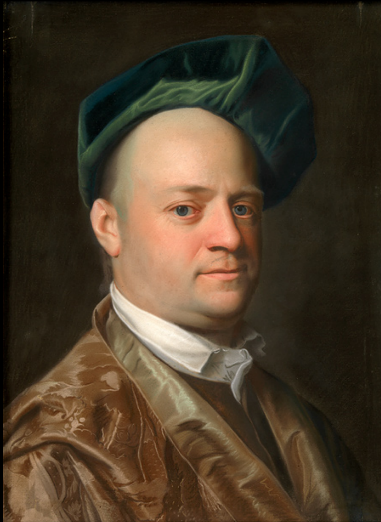
Ebenezer Storer II by John Singleton Copley c. 1767 (Metropolitan Museum of Art)