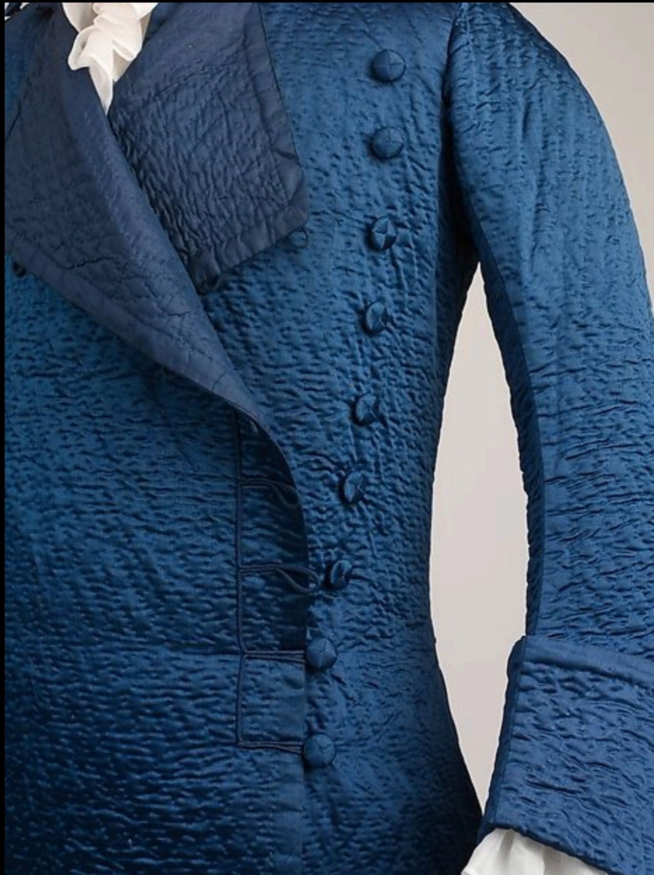
Chinese Trade Silk Banyan c. 1760 (Metropolitan Museum of Art)