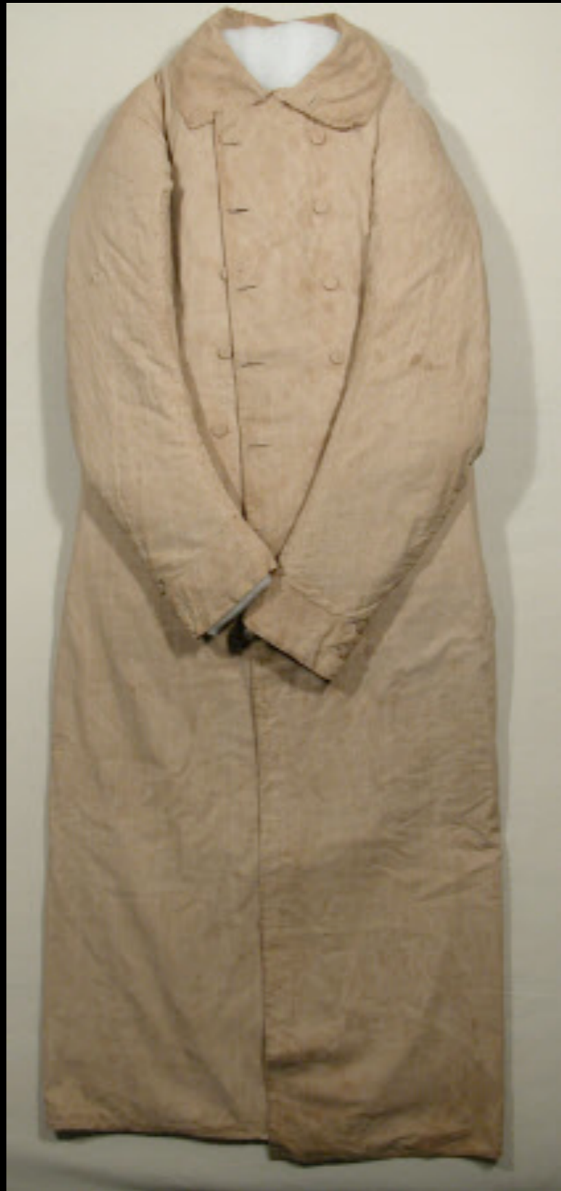
Banyan c. 1780 - 1800 (National Trust)