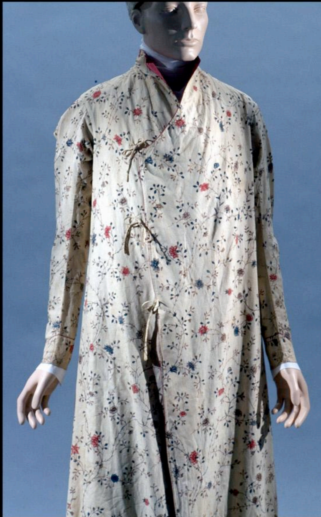
English Banyan of Indian Silk c. 1770 - 1800 (Colonial Williamsburg)