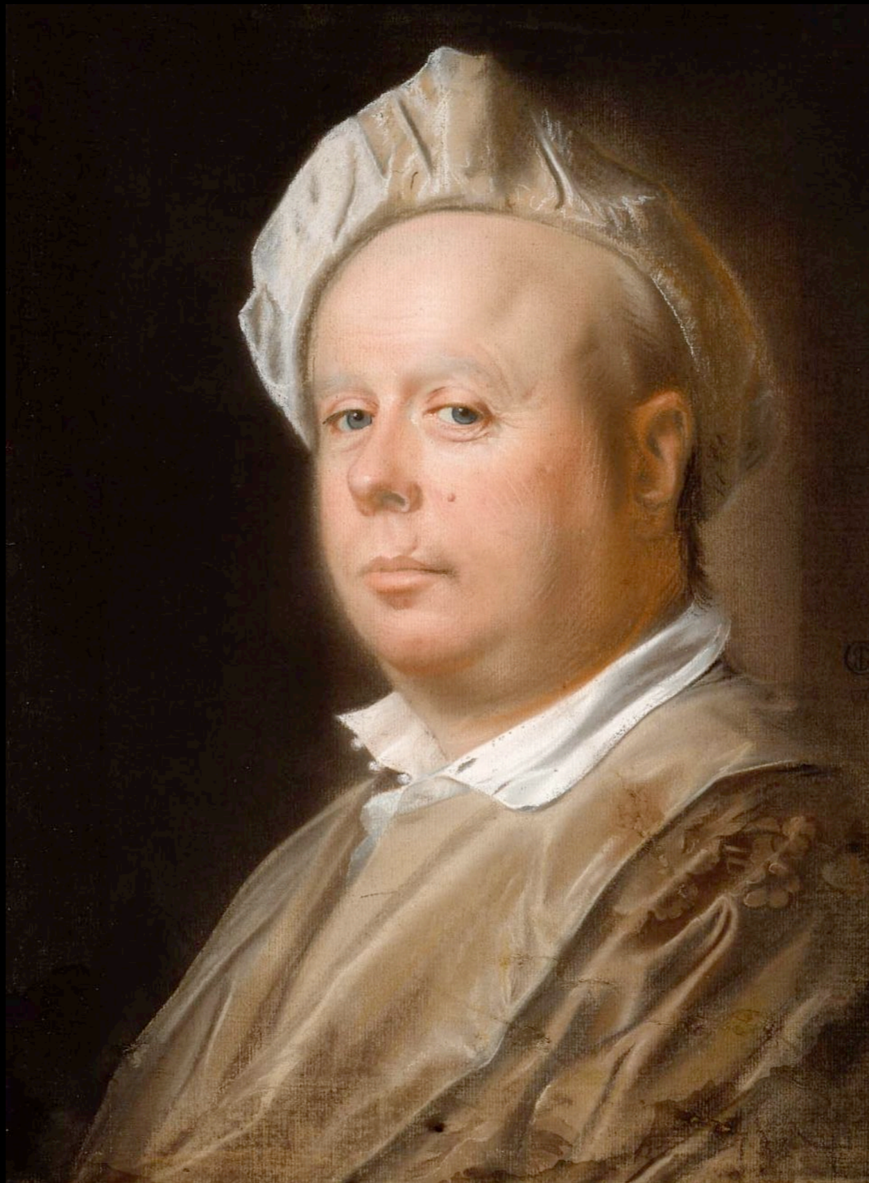
Joseph Green by John Singleton Copley c. 1769 (Norma & Roger Alfred Saunders Gallery)