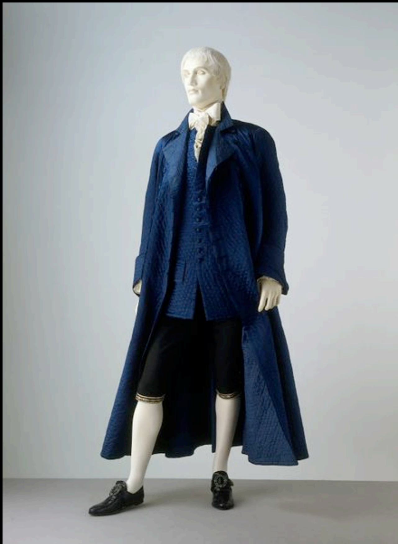
English Quilted Silk Night Gown c. 1780 - 1800 (Victoria & Albert)