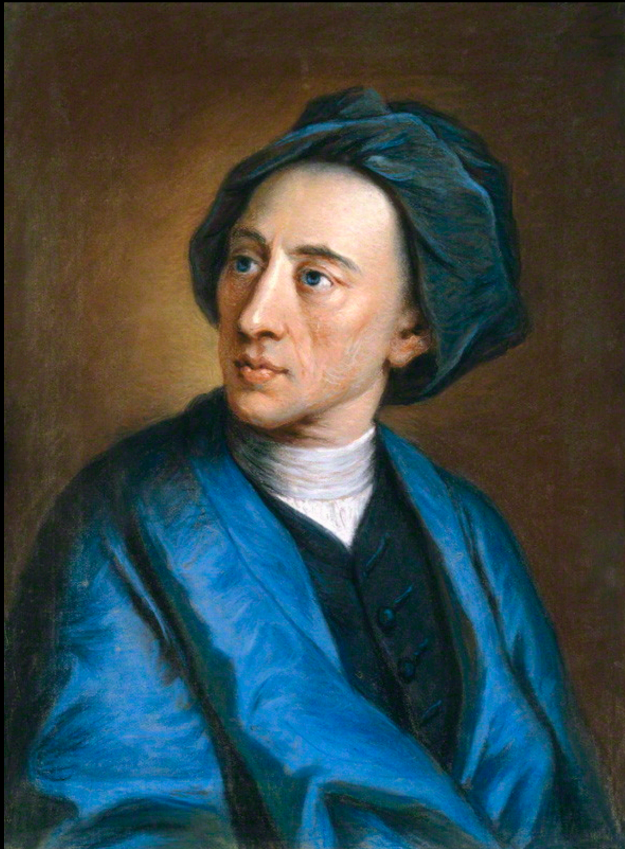
Alexander Pope by William Hoare c. 1739 (National Portrait Gallery)