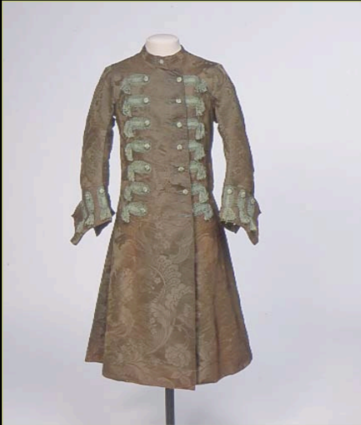
English Coat-Style Silk, Damask Wool and Olive Green Banyan