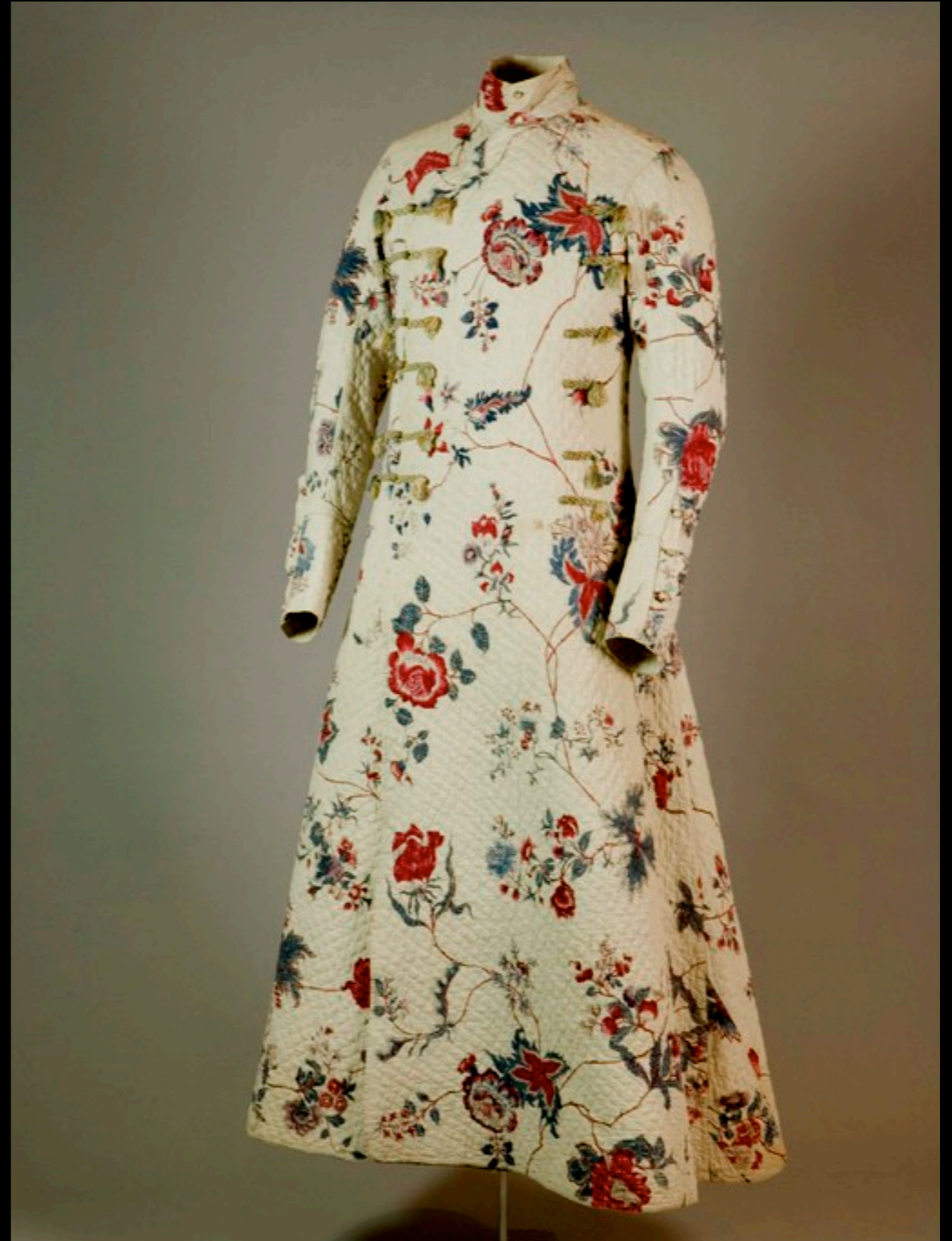
Indian Cotton Banyan c. 1770 - 1780 (Royal Pavilion & Museums, Brighton & Hove)