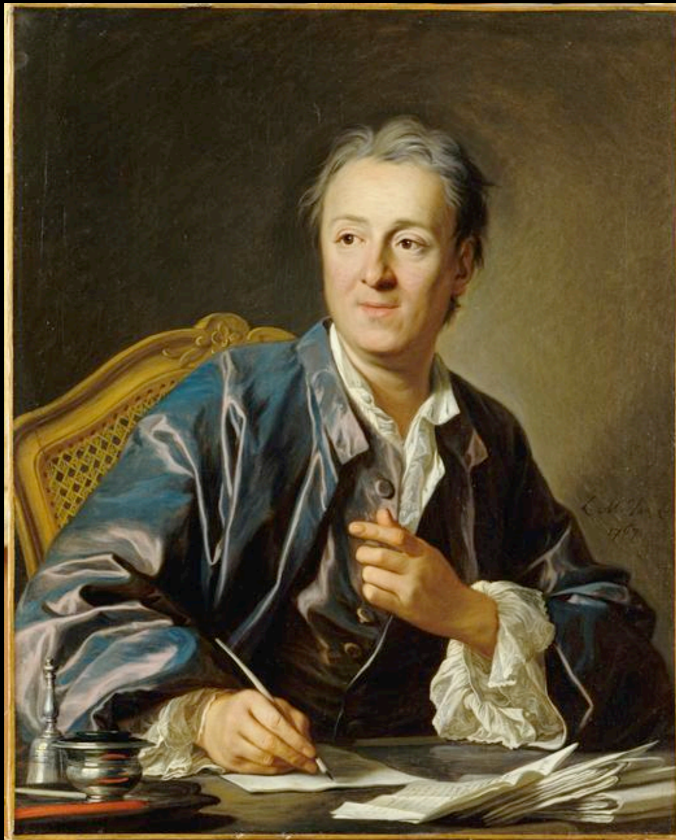
Denis Diderot by Louis Michel van Loo 1767