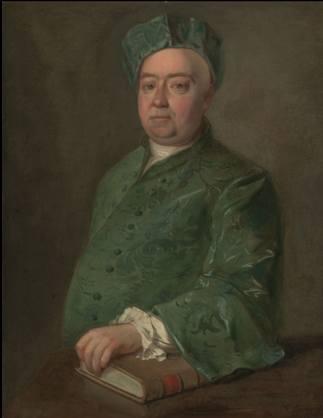
Unknown by Philippe Mercier 1746