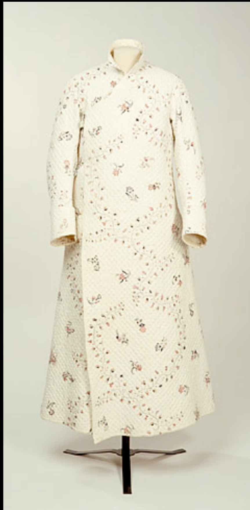
English or European Banyan c. 1760 - 1770 (Manchester Art Gallery)