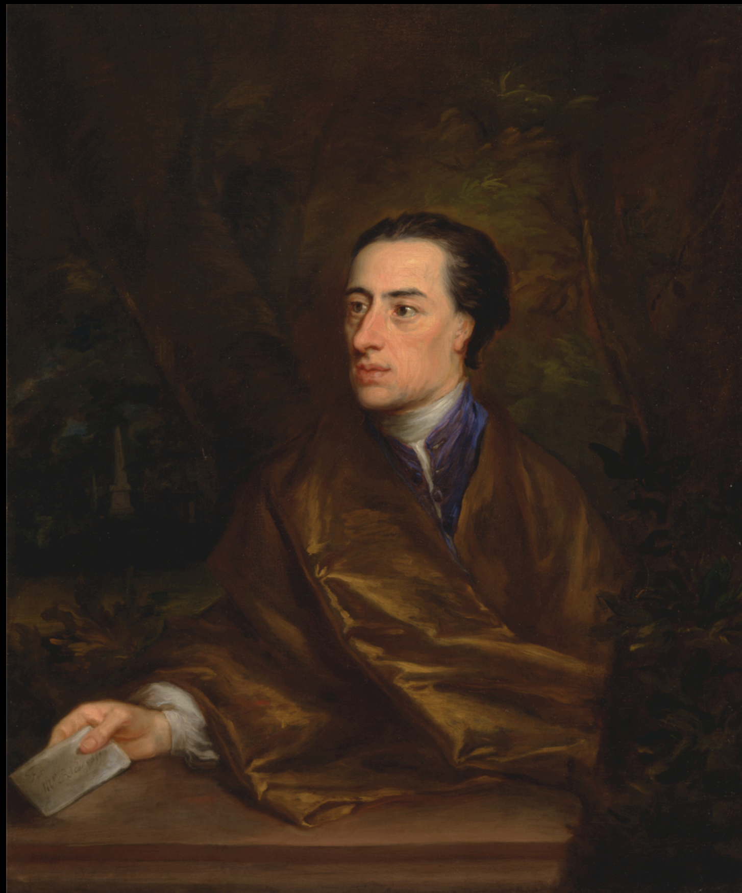
Alexander Pope by Jonathan Richardson the Elder c. 1738 (Yale Center for British Art)