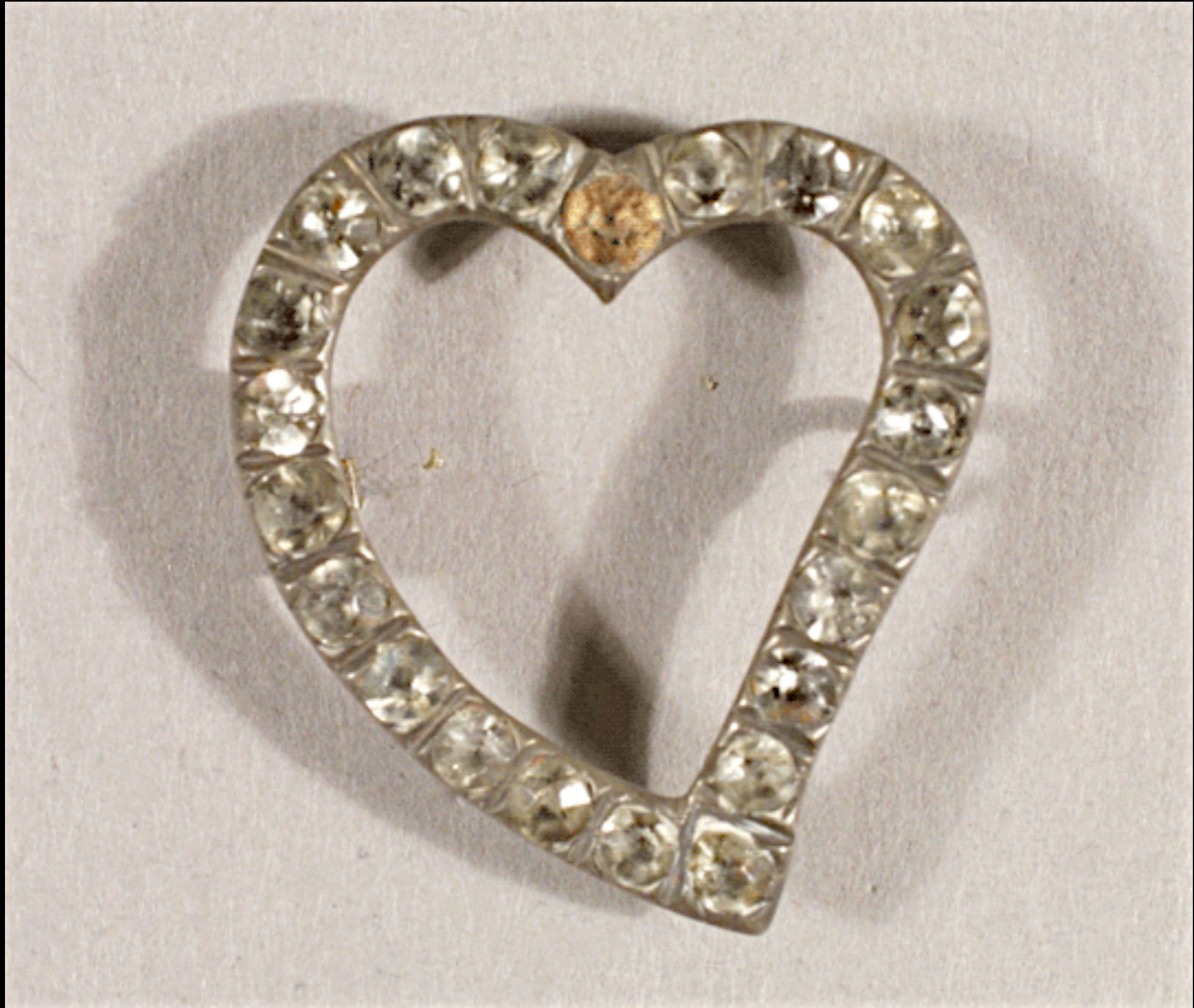
English Silver with Pastes Shirt Buckle