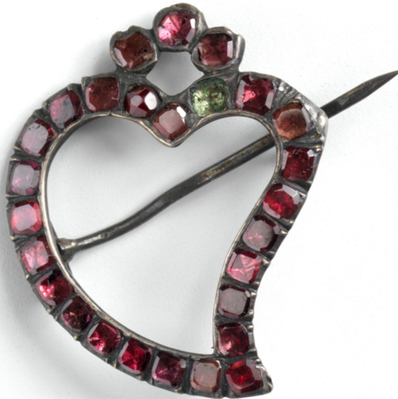
American Silver & Garnet Shirt Buckle