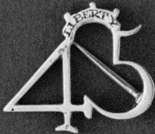
Possible Shirt Buckle