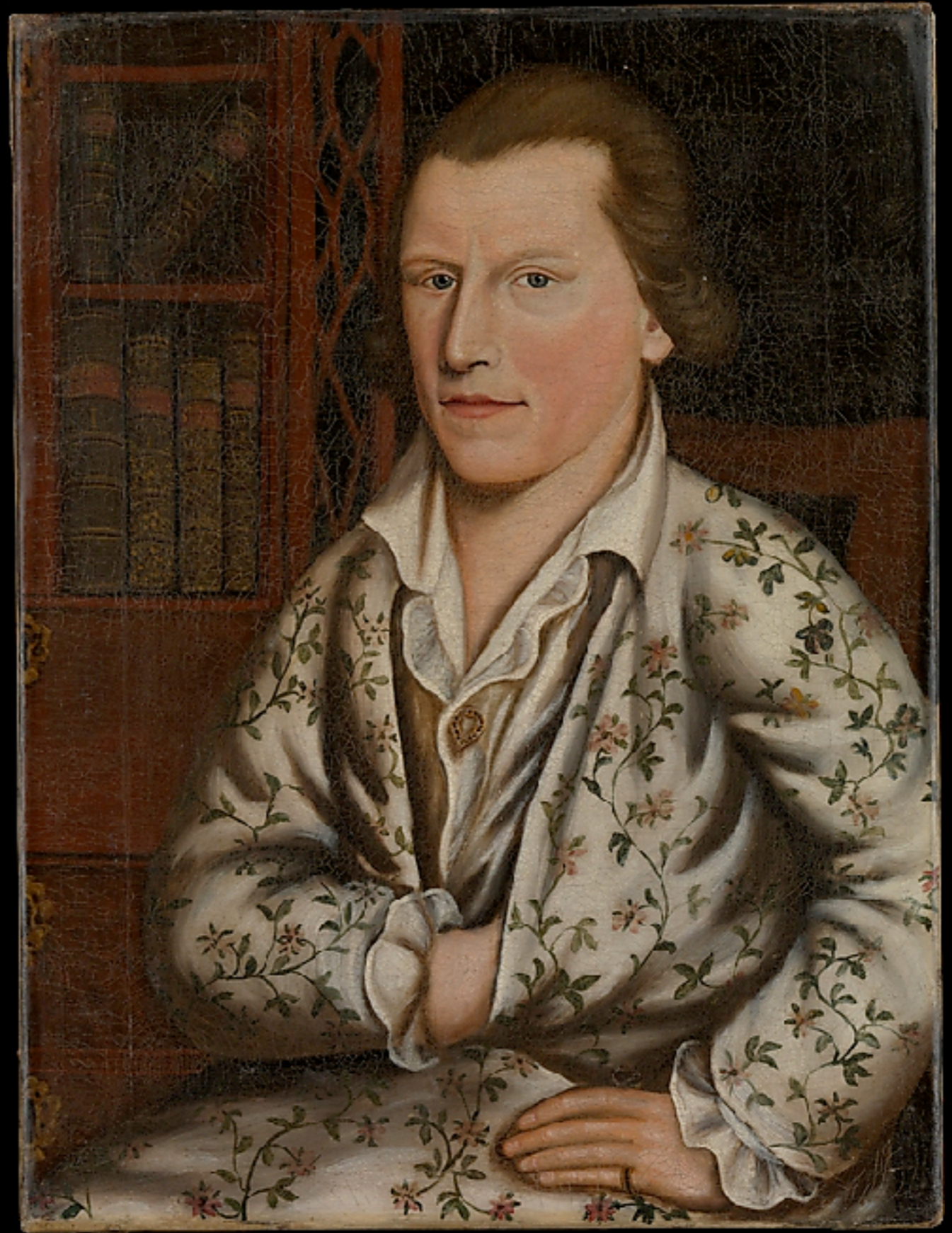
William Duguid Wearing a Heart Shaped Shirt Buckle Prince Demah Barnes 1773 (Metropolitan Museum of Art)