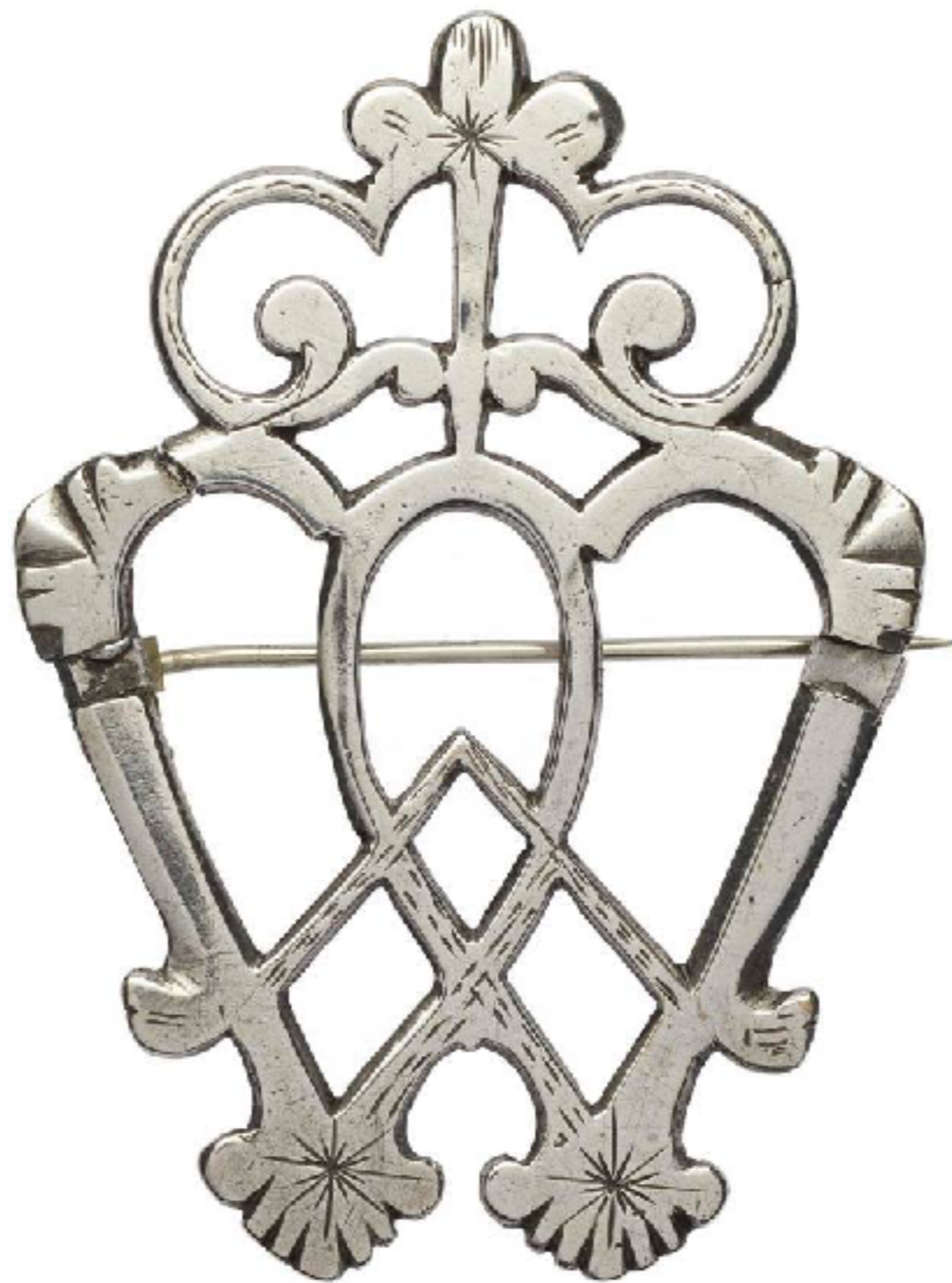
Scottish Silver Brooch, Often Worn as a Shirt Buckles by Alexander Stewart Late 18th Century (National Museums Scotland)