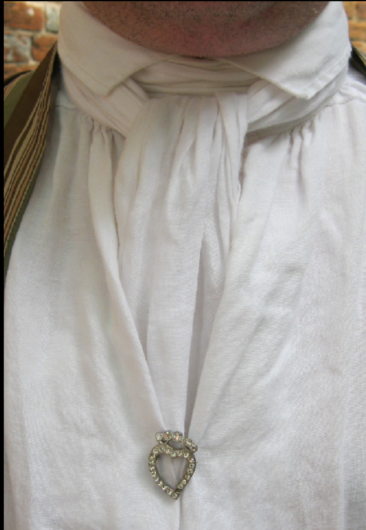
A Silver & Pastes Shirt Buckle Worn on a Recreated Linen Shirt Note the Proper Fit of the Collar to the Neck and the Fit of the Neck Cloth