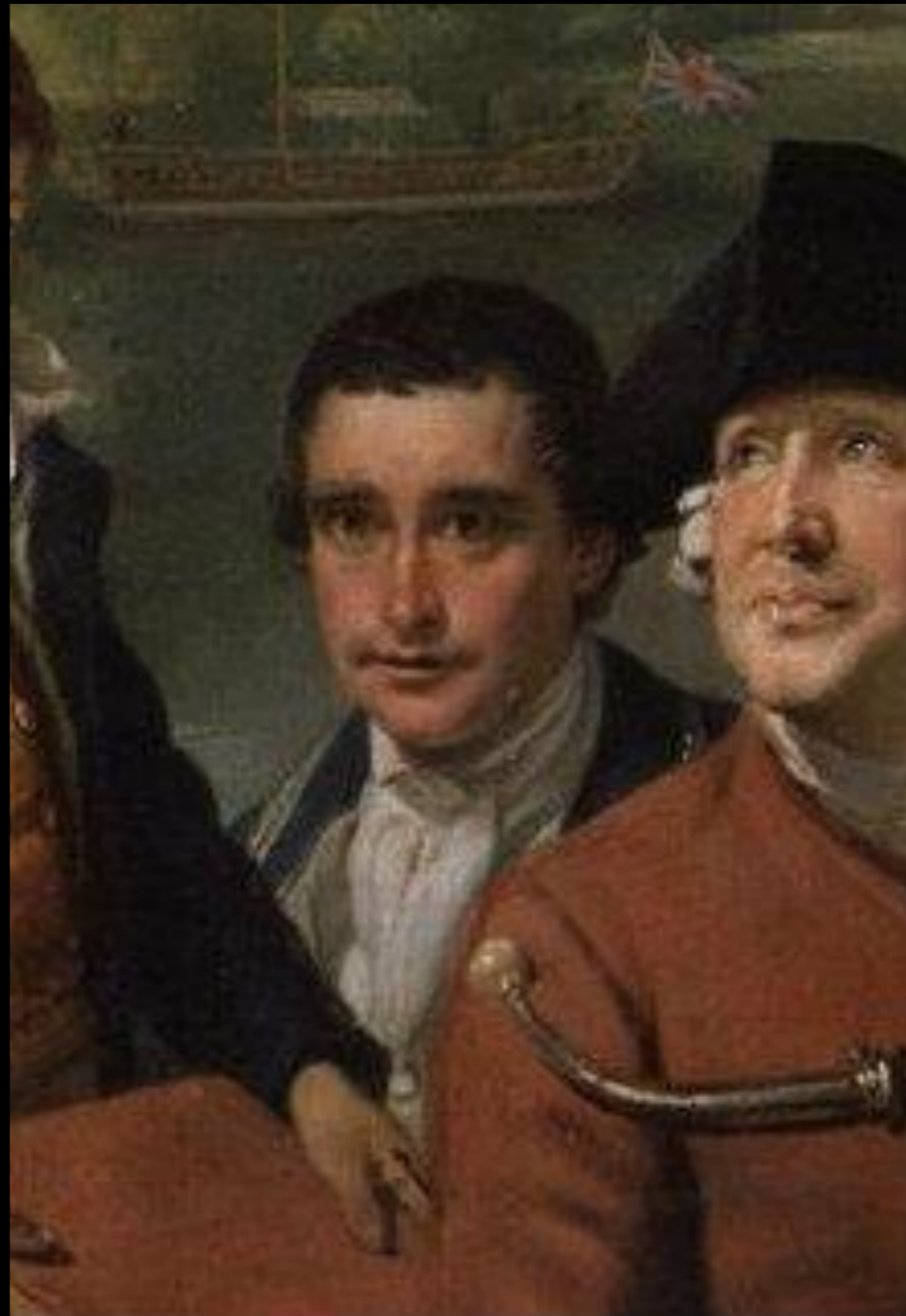
Detail: Wearing of a Heart Shaped Shirt Buckle "The Sharp Family" by Johan Joseph Zofanny c. 1779 - 1781 (The National Portrait Gallery)