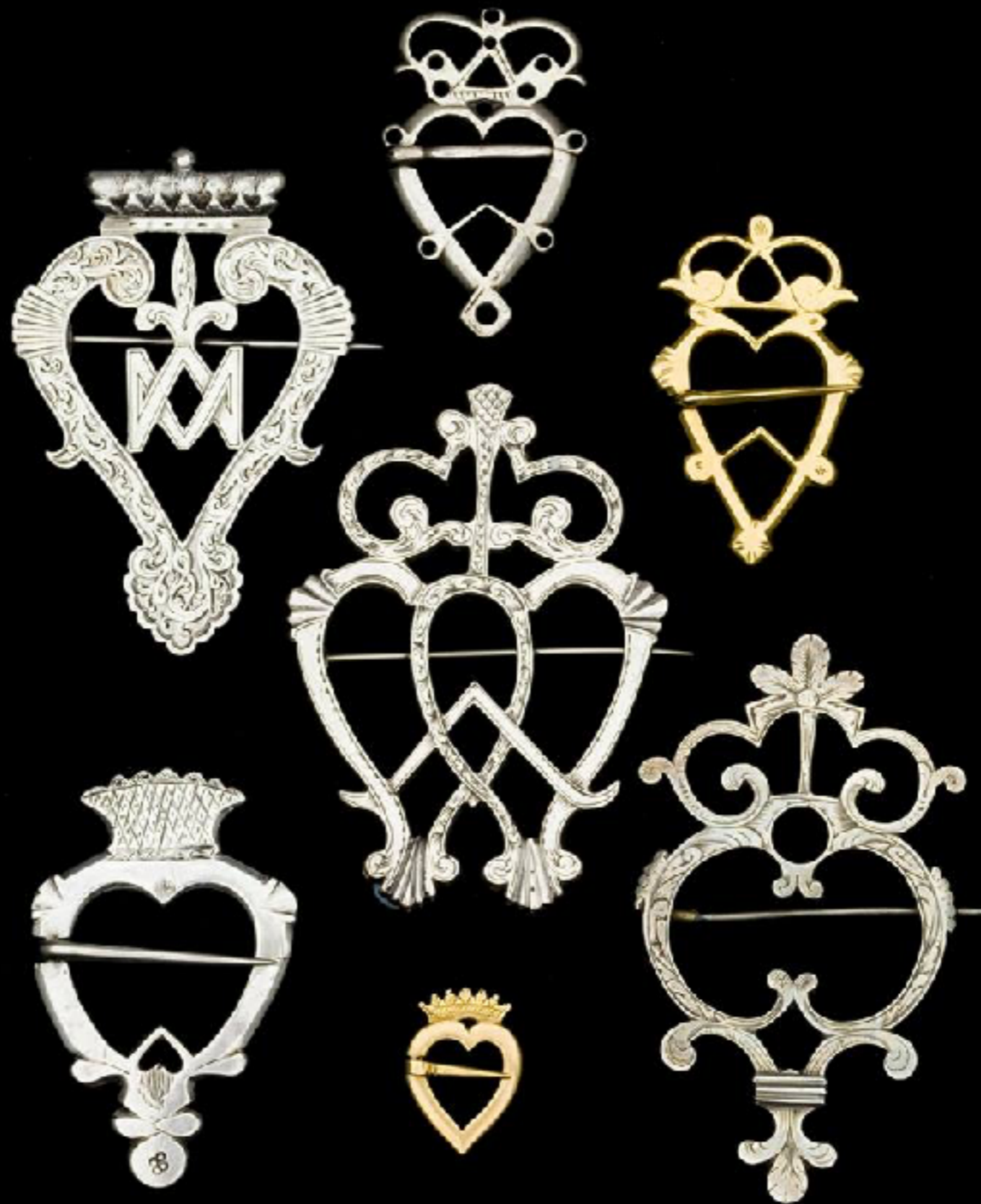
Scottish Brooches, Often Worn as Shirt Buckles One Inscribed "CC 1760" (National Museums Scotland)