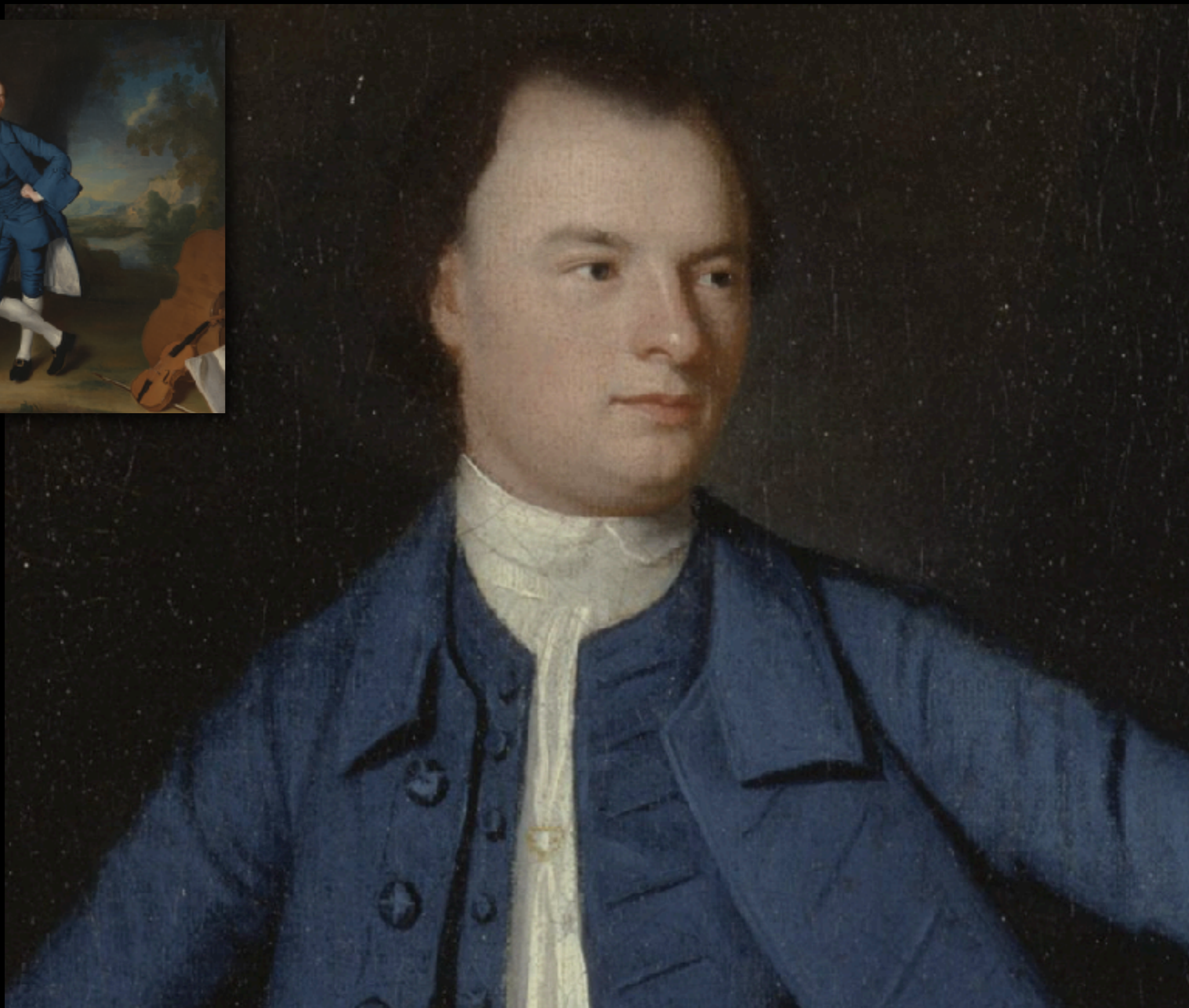
Portrait of a Gentleman by George Romney c. 1758 - 1760 (Yale University Art Gallery)