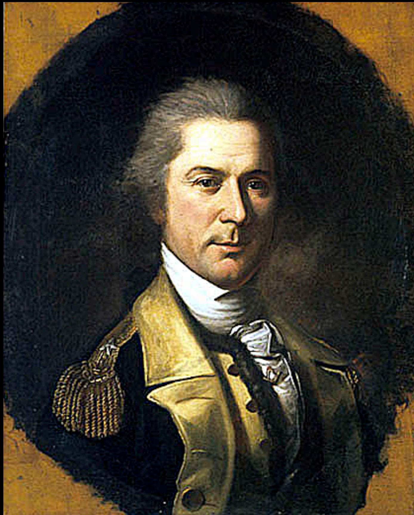
Brigadier General Otho Holland Williams Wearing a Masonic Shirt Buckle by Charles Willson Peale 1784 (Independence National Historic Park)