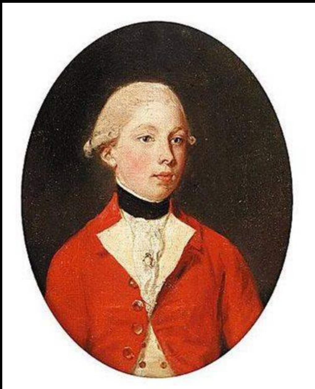
Portrait of a Young Officer by Thomas Hickey c. 1770