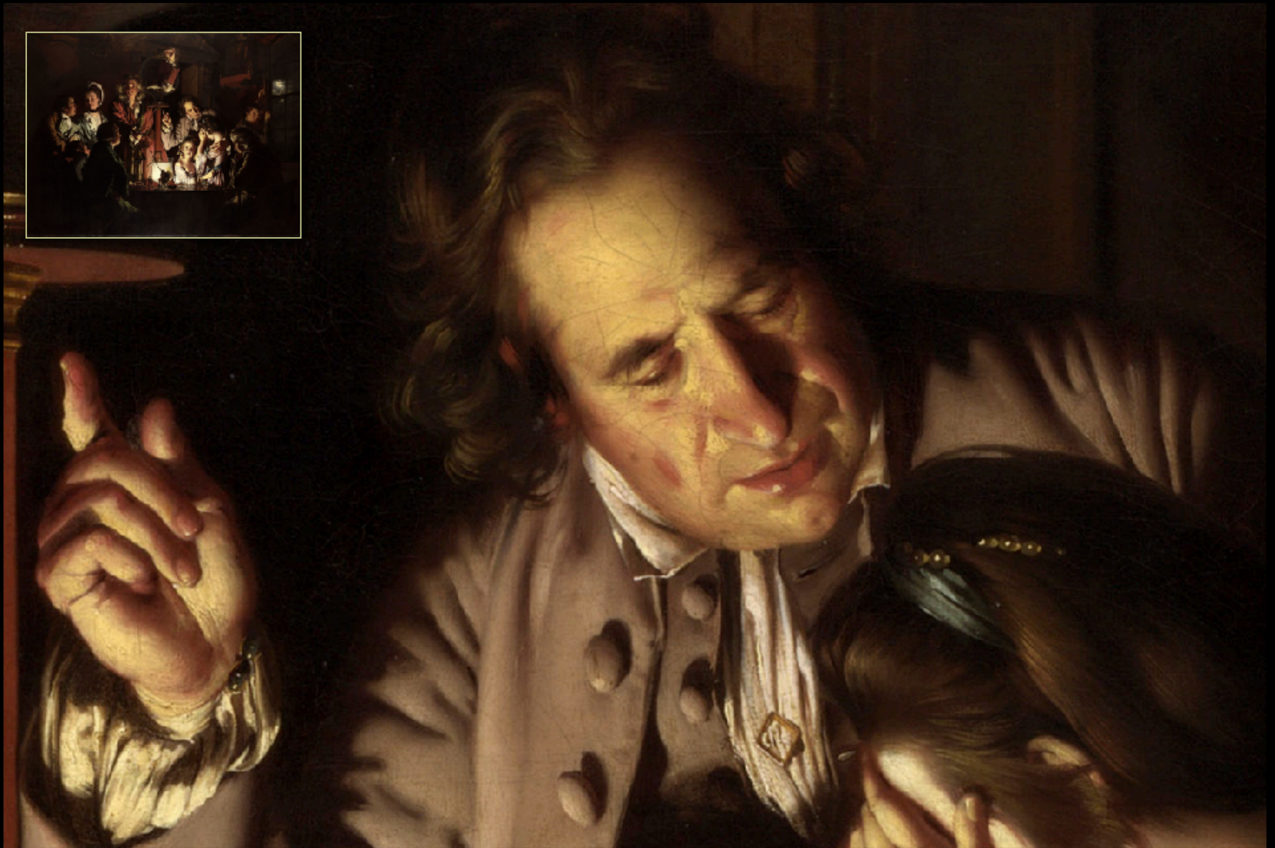
An Experiment on a Bird in an Air Pump by Joseph Wright of Derby 1768 (National Portrait Gallery, London)