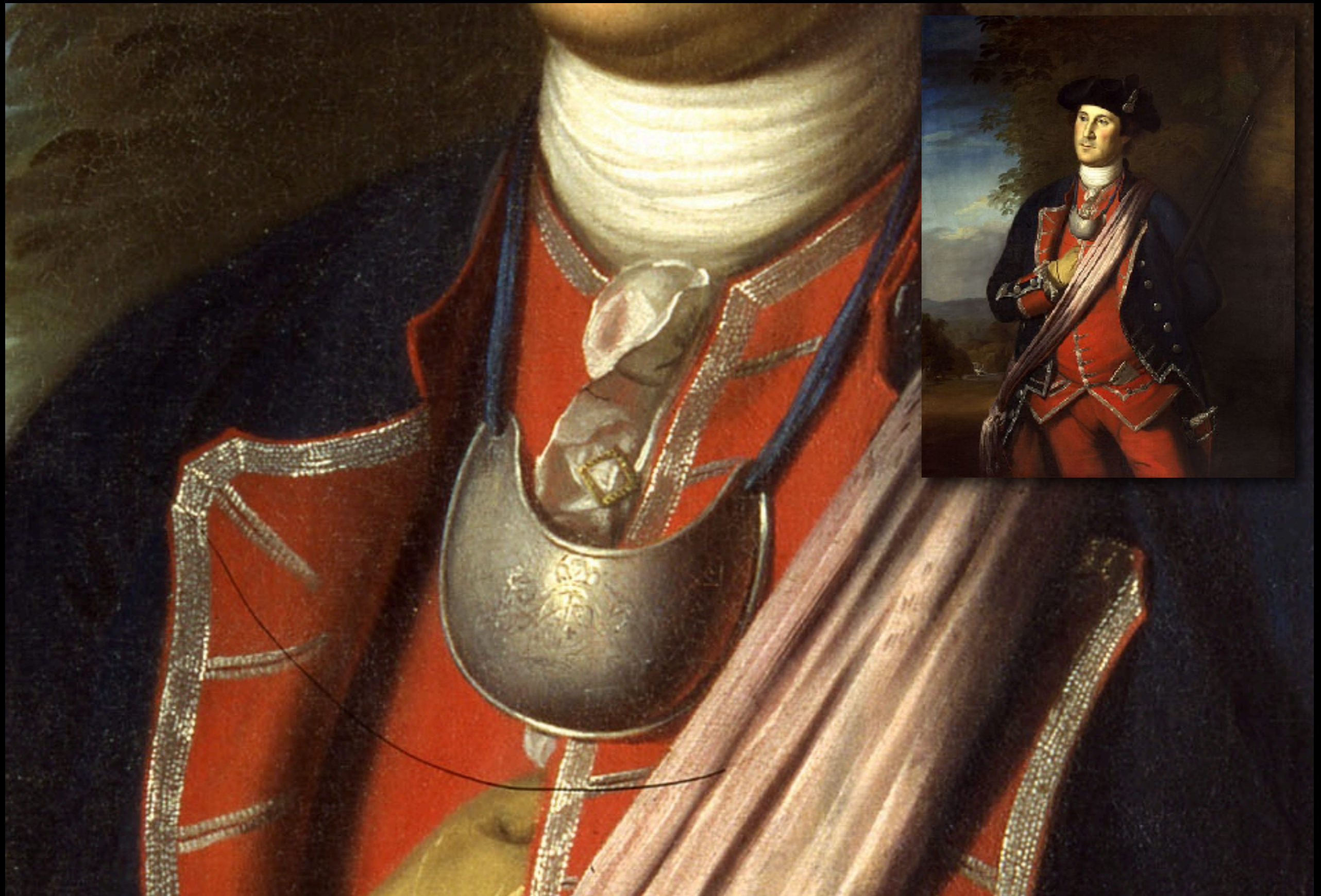
George Washington by Charles Willson Peale c. 1772 (Washington & Lee University)