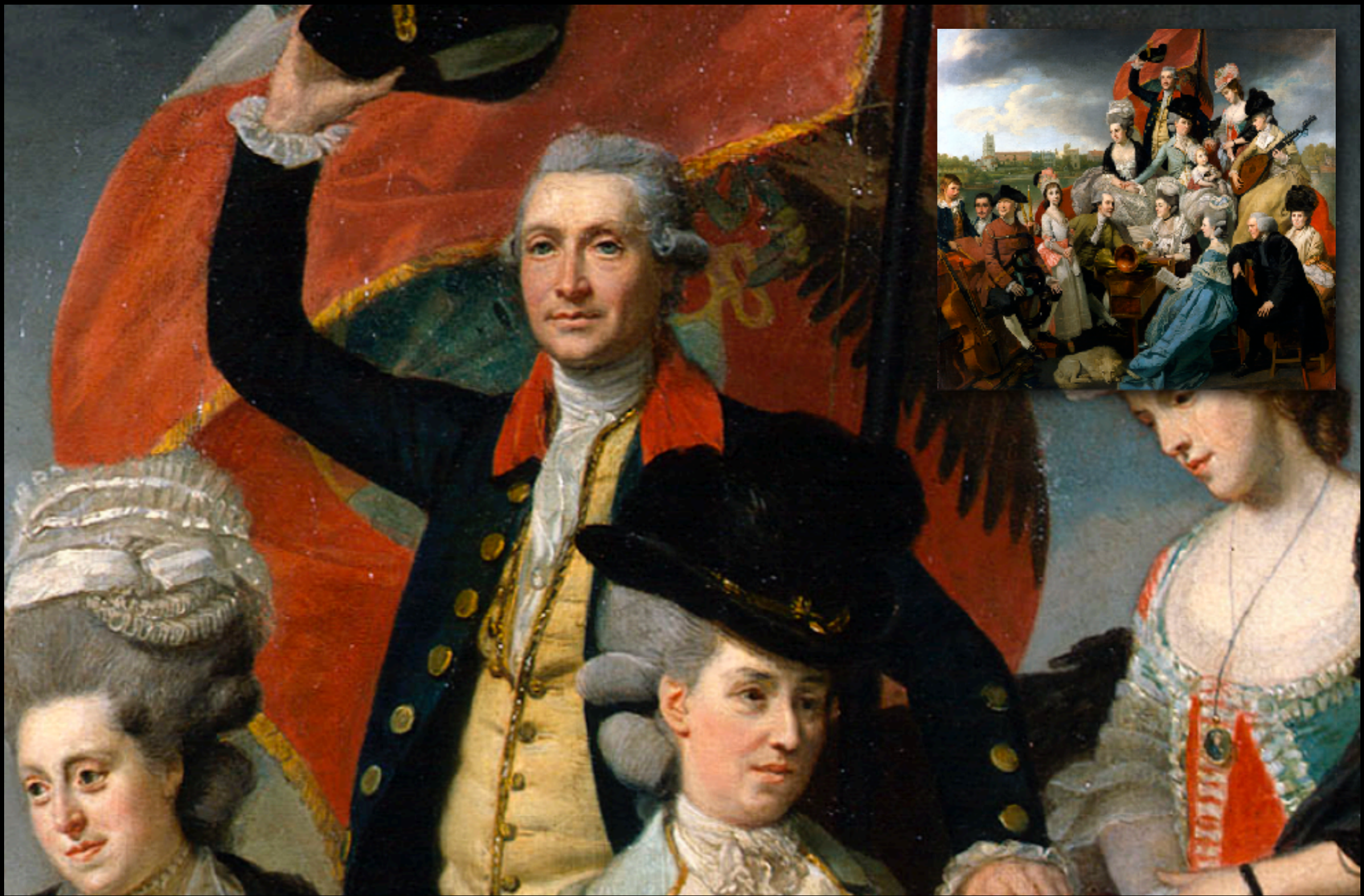
Detail: Wearing of a Heart Shaped Shirt Buckle "The Sharp Family" by Johan Joseph Zofanny c. 1779 - 1781 (The National Portrait Gallery)