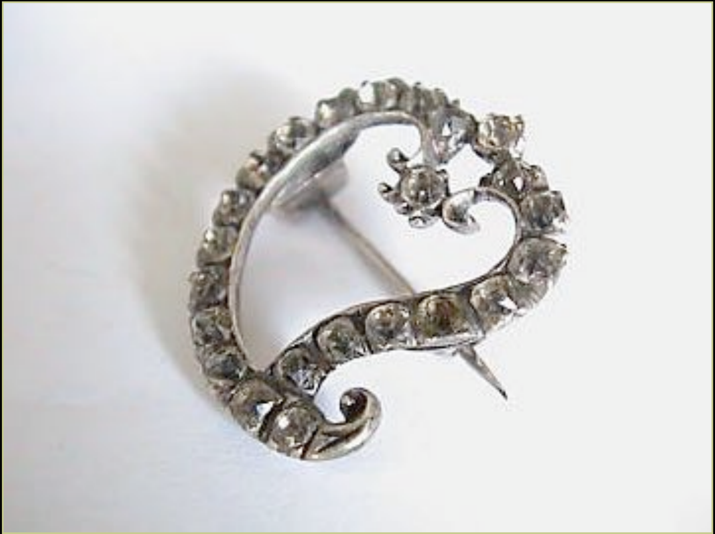
English Silver with Glass Pastes Shirt Buckle