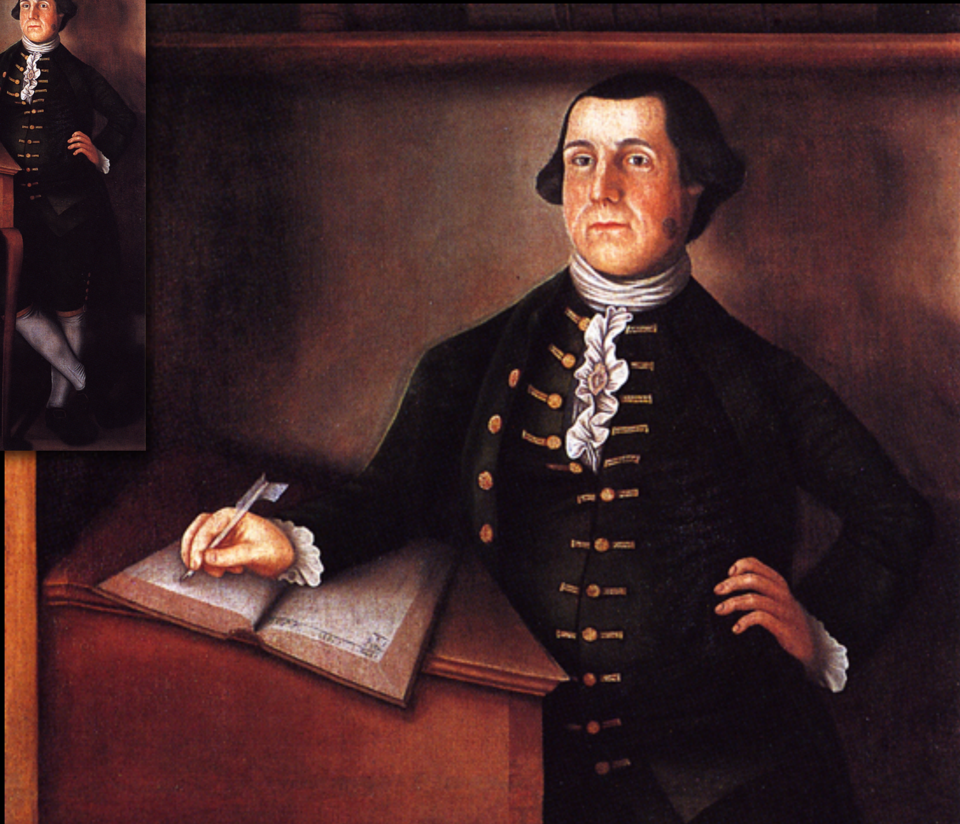
Judge Ebenezer Devotion of Connecticut Wearing a Heart Shaped Shirt Buckle by Winthrop Chandler 1772 (Lyman Allen Art Museum, New London, Connecticut)