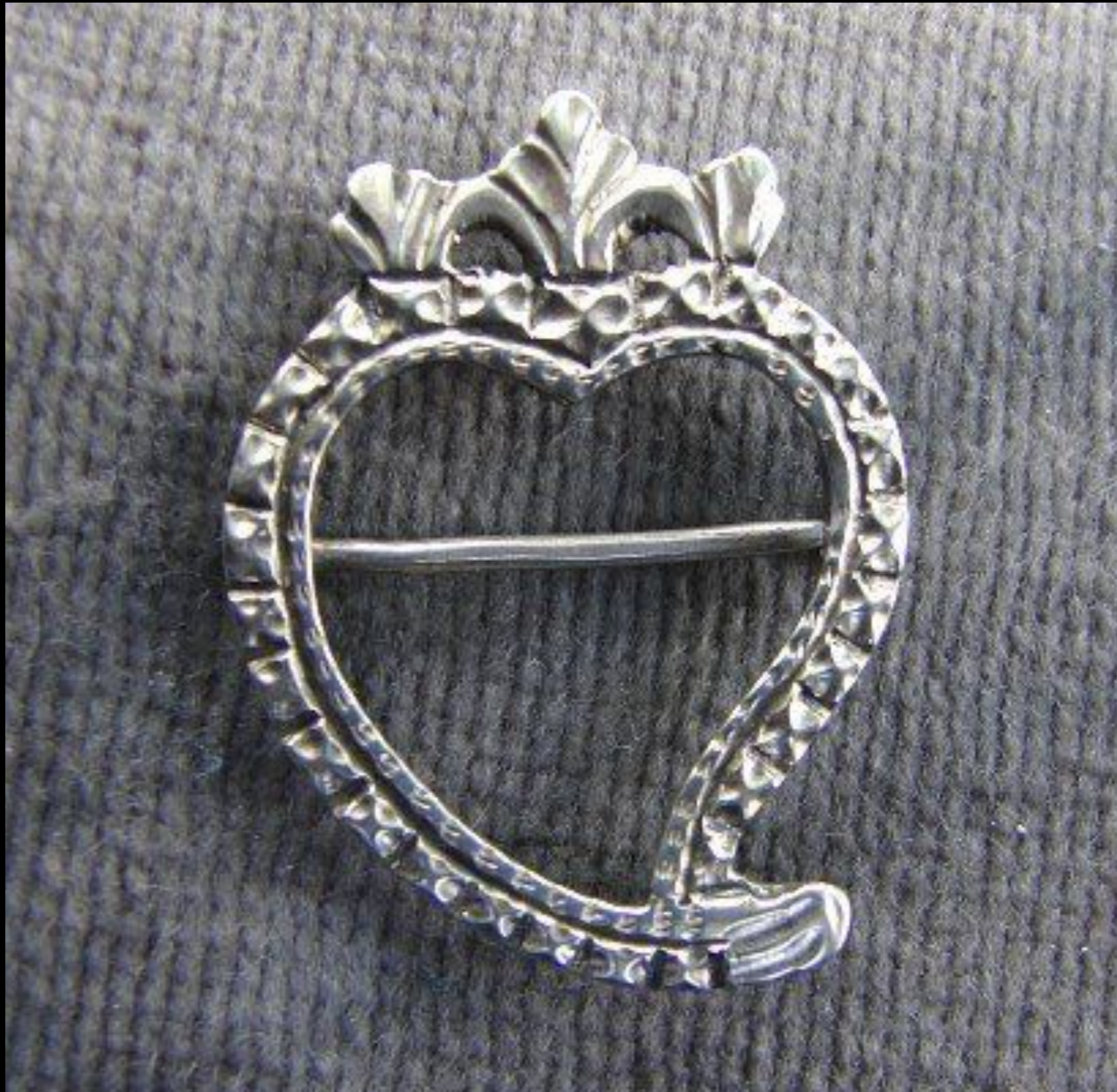
English Silver Shirt Buckle Mid - Late 18th Century (Private Collection)