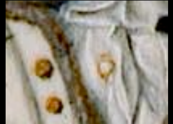
Brigadier General Otho Holland Williams wearing a Heart Shaped Shirt Buckle by Charles Wilson Peale (Public Domain)