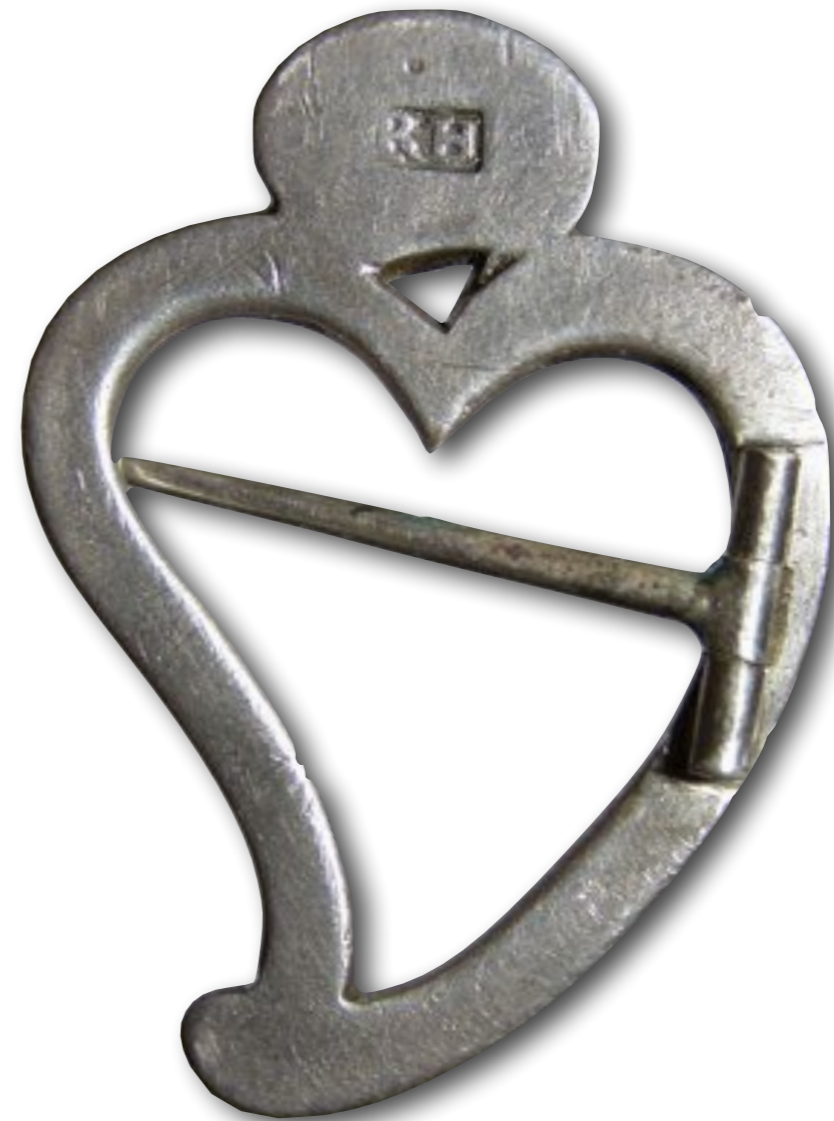
English Silver Shirt Buckle Mid - Late 18th Century (Private Collection)