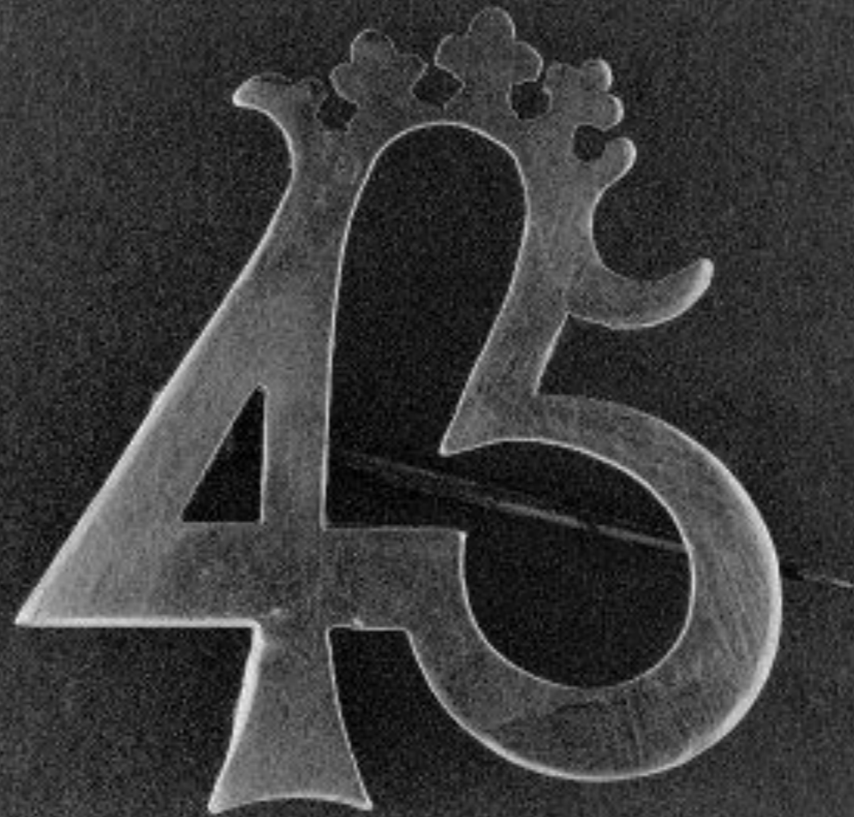
English "45" / John Wilkes Silver Buckles or Brooches The Smaller Buckle May have been used to Close a Shirt, but this is Conjecture c. 1763 (The British Museum)