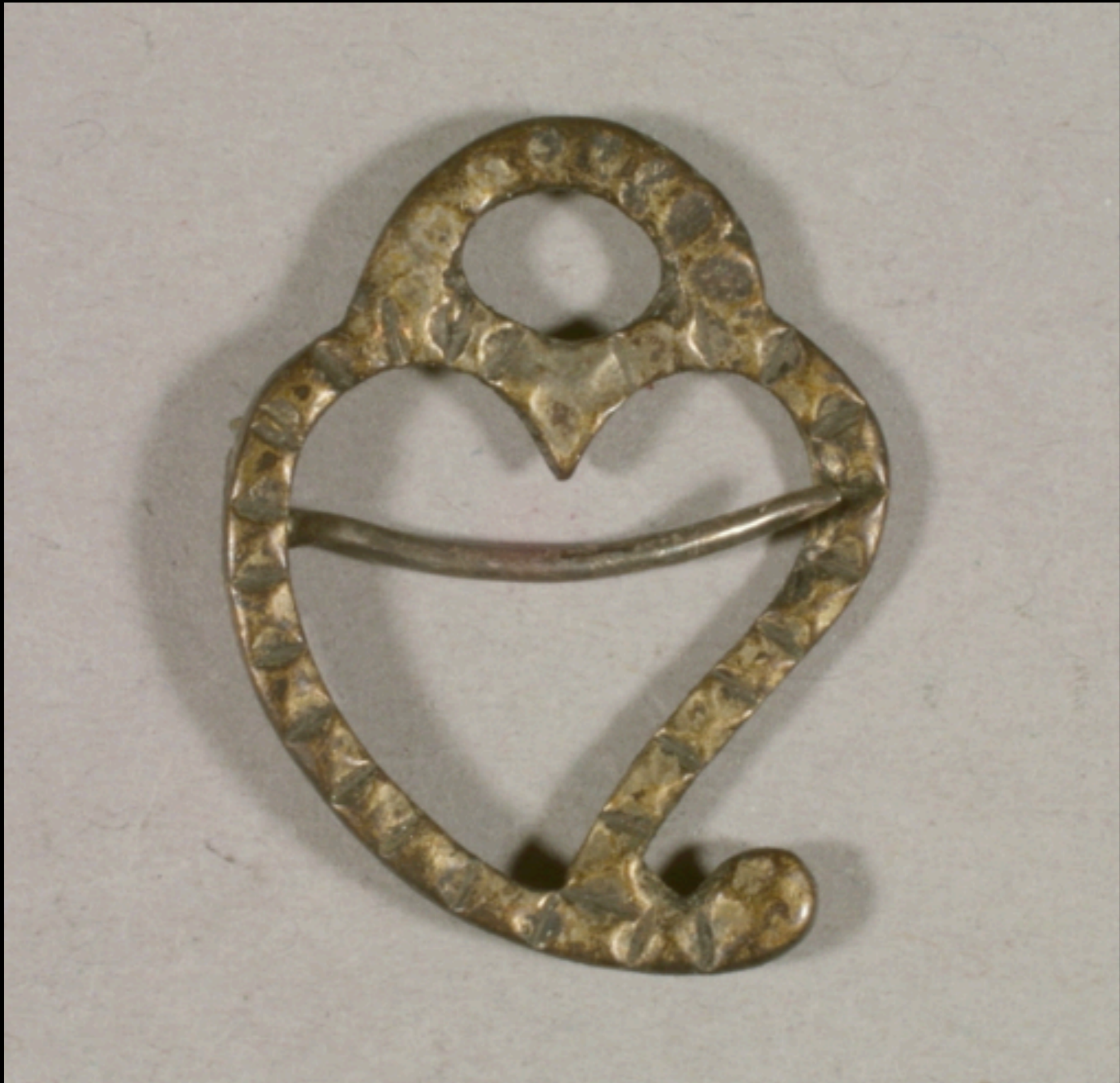
English Silver Shirt Buckle c. 1750 - 1780 (Historic New England)