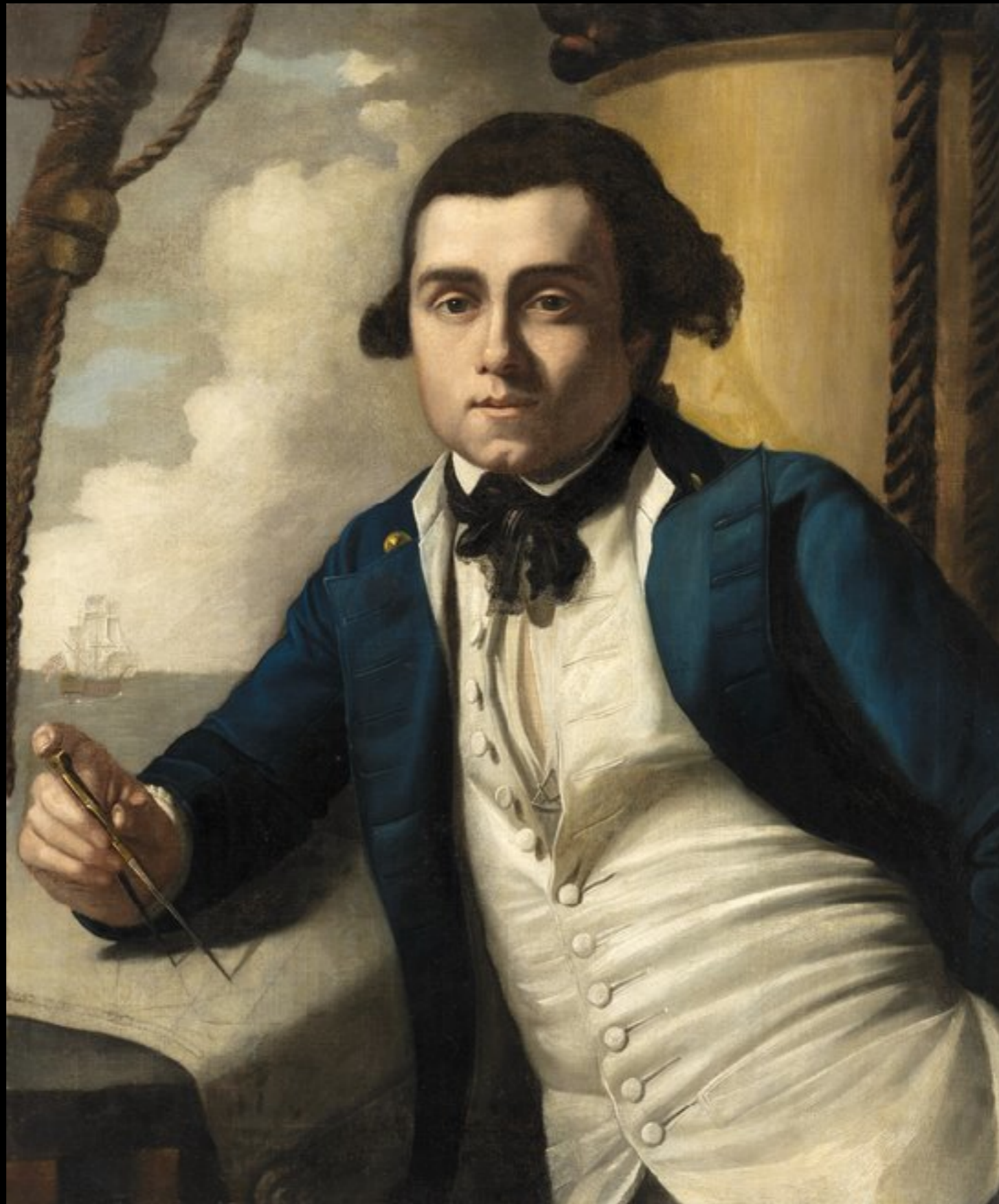
Master & Lieutenant William Bligh of the H.M.S. Resolution, Later Captain of the H.M.S. Bounty, Wearing a Masonic Shirt Buckle by John Webber 1776 (National Portrait Gallery, Canberra)