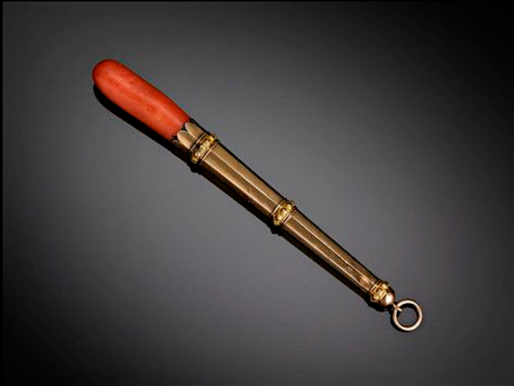
English Gold & Coral Baby Teether Mid 18th Century