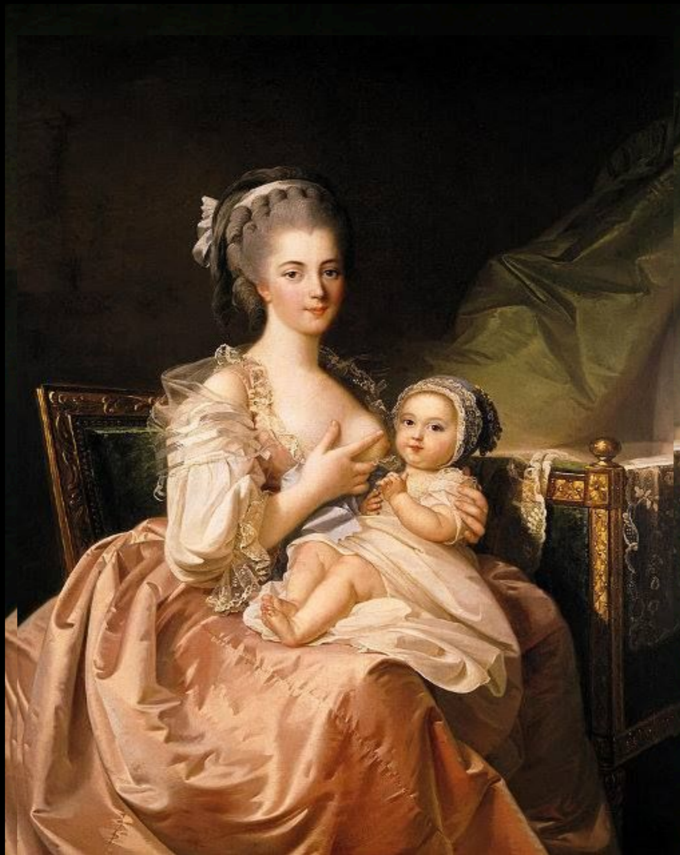
The Young Mother (Louis XIV) by Jean Laurent Mosnier 1782 (Musée municipal des Ursulines, Mâcon, France)