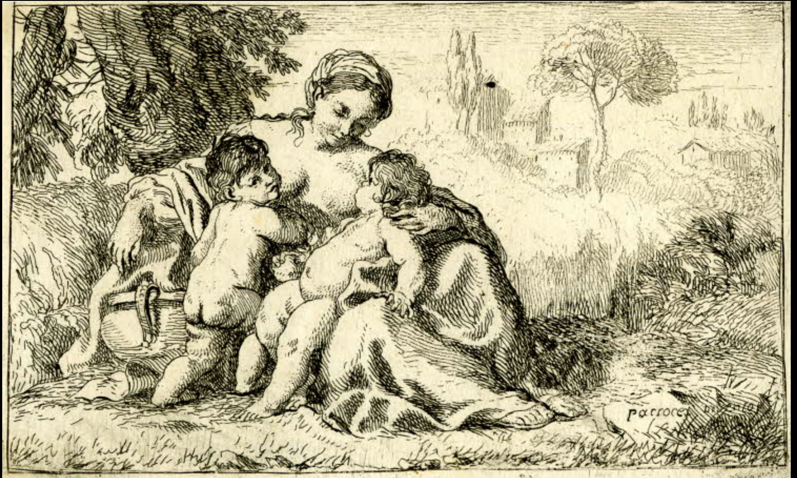
“Charity” A French Woman Breastfeeding Two Infants by Pierre Parrocel c. 1685 - 1739 (The British Museum)