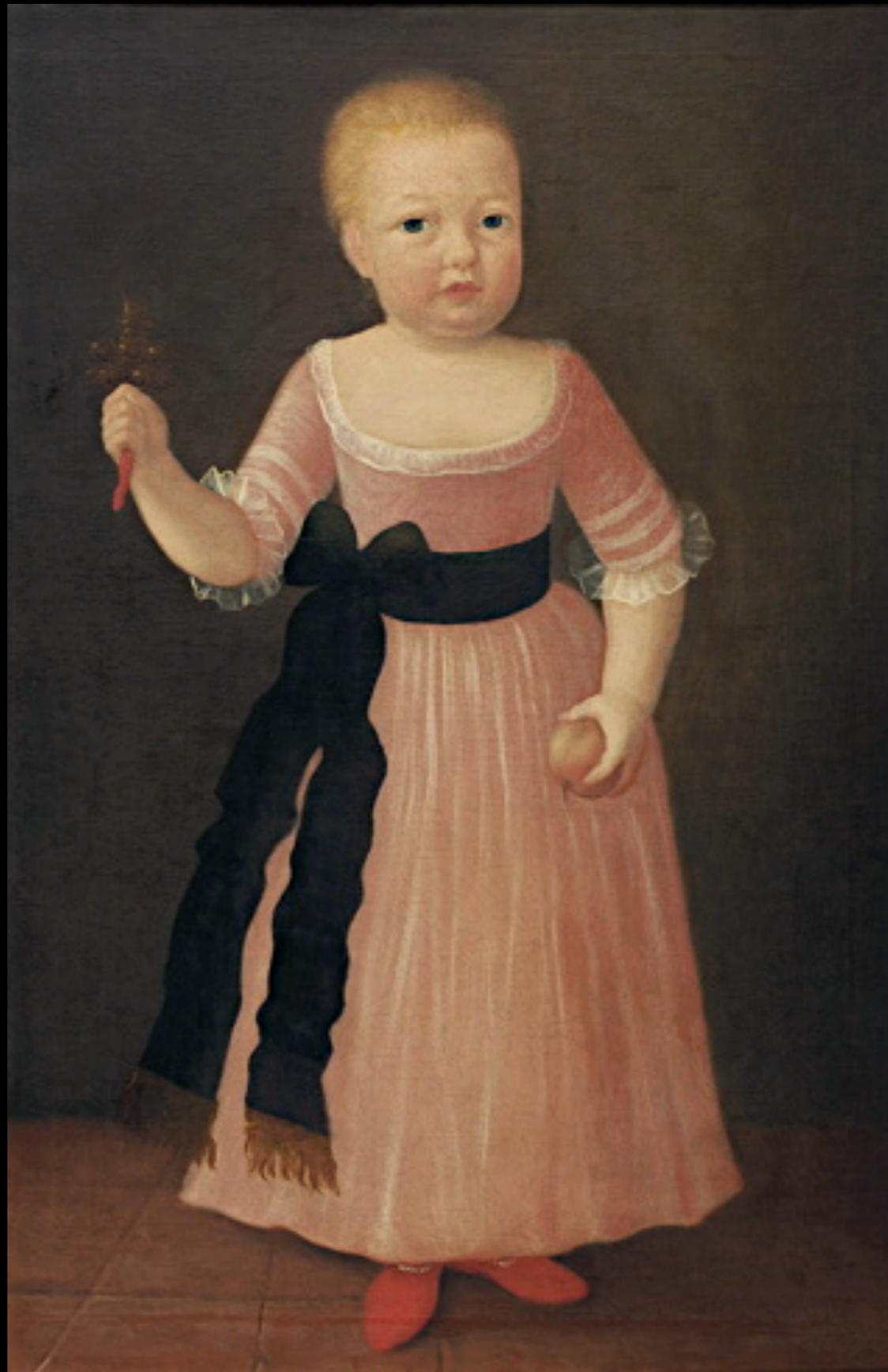
A Child Holding a Rattle with Whistle & Bells and a Piece of Fruit c. 1760 (Eldred's)