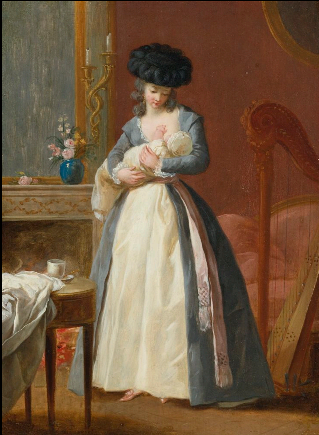
A Lady, Said to be Madame Danloux, Nursing her Child in a Drawing Room by François-Guillaume Ménageot Late 18th Century