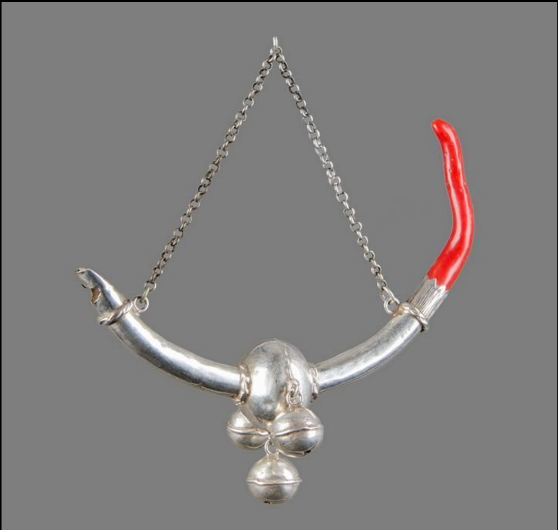
Silver & Coral Baby Rattle & Teether with Whistle & Bells 17th Century (Private Collection)