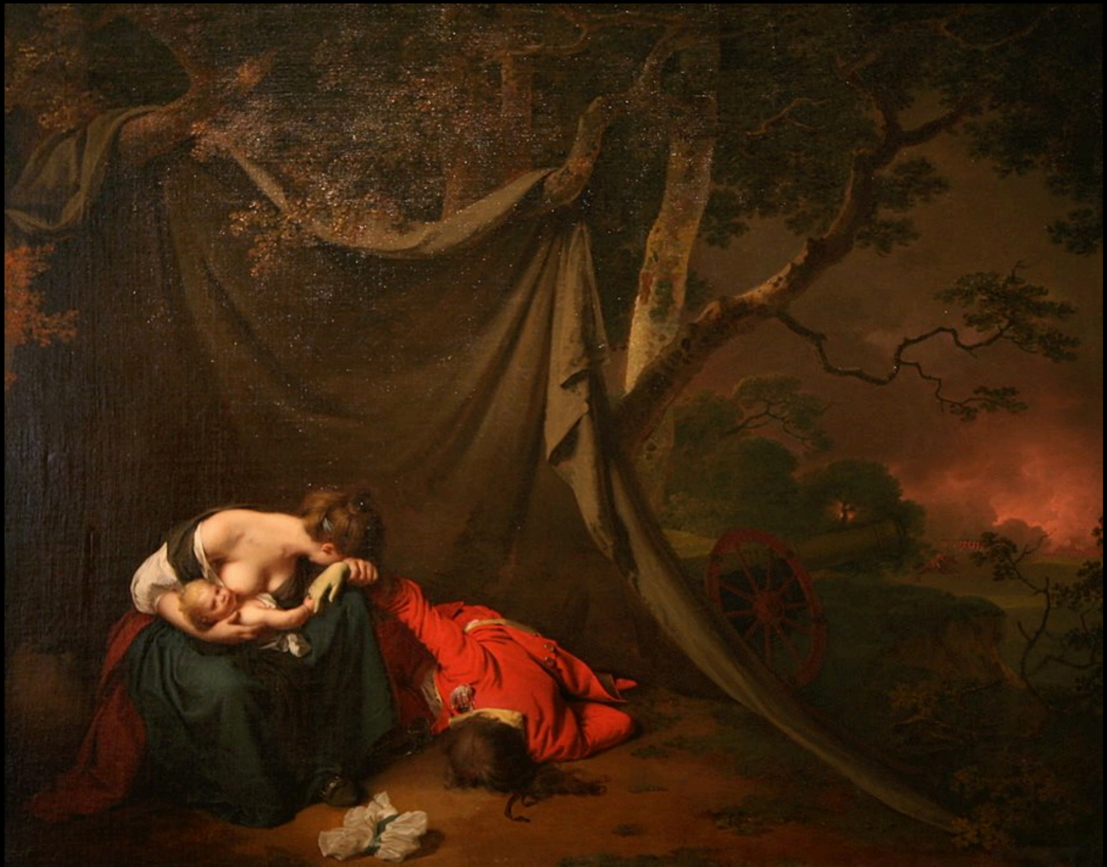
"Dead Soldier" Joseph Wright of Derby 1789 (LACM - California Palace of the Legion of Honor)