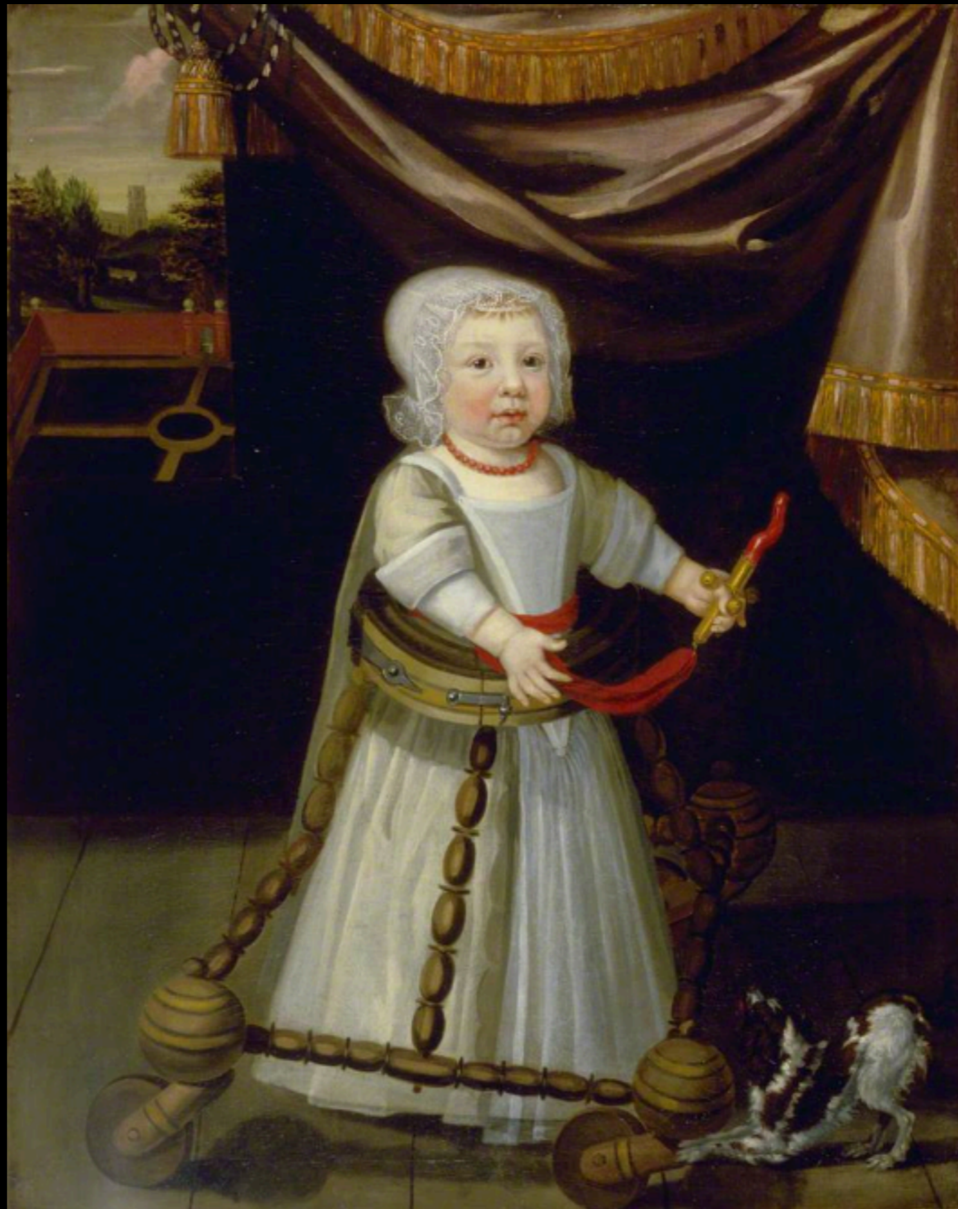
An Unknown European Boy Unknown Artist c. 1650 - 1660 (Bowes Museum)