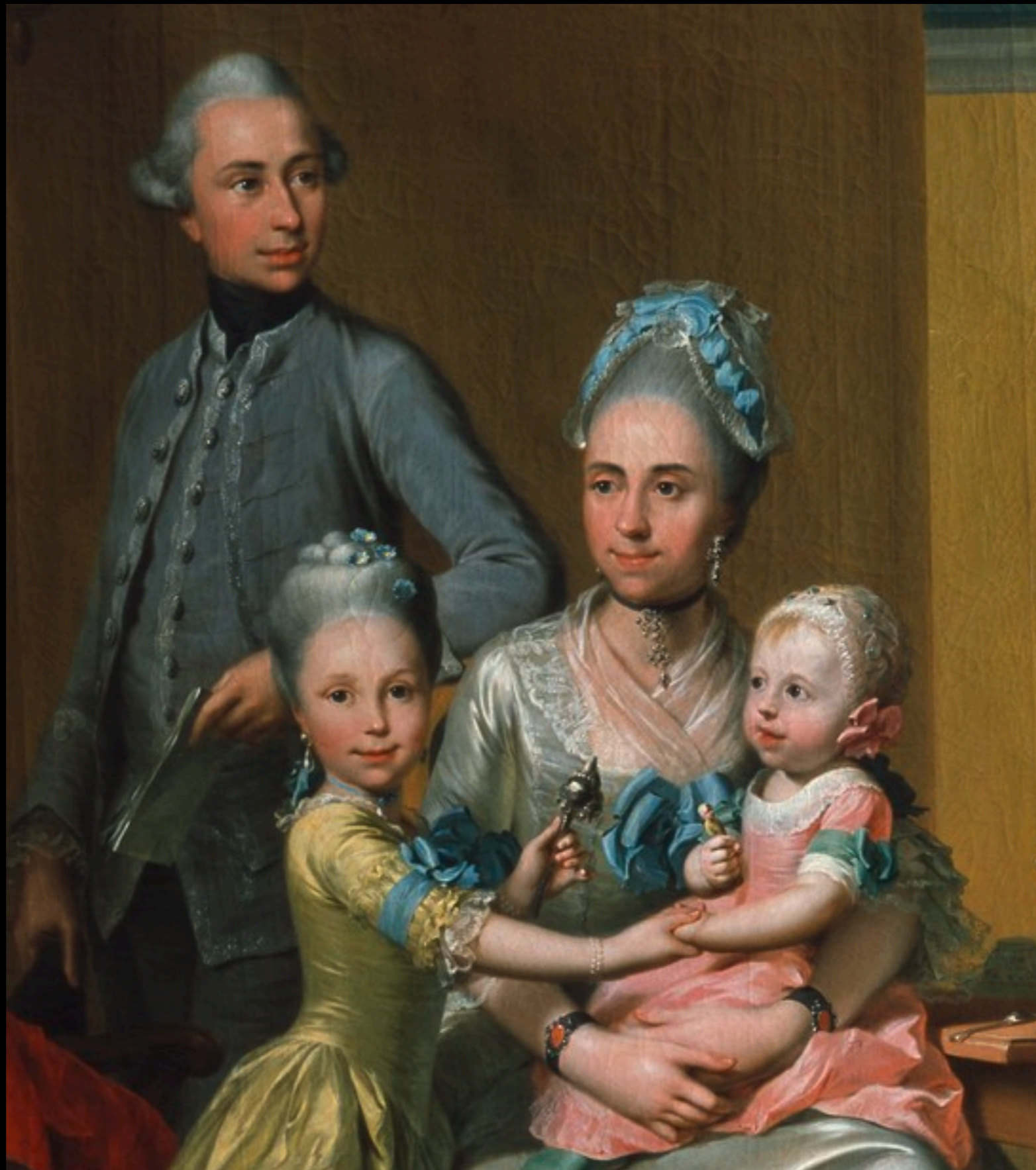
The Boris Family of Holland by Anton Wilhelm Tischbein c. 1770 - 1775 (Frankfurt Historical Museum)