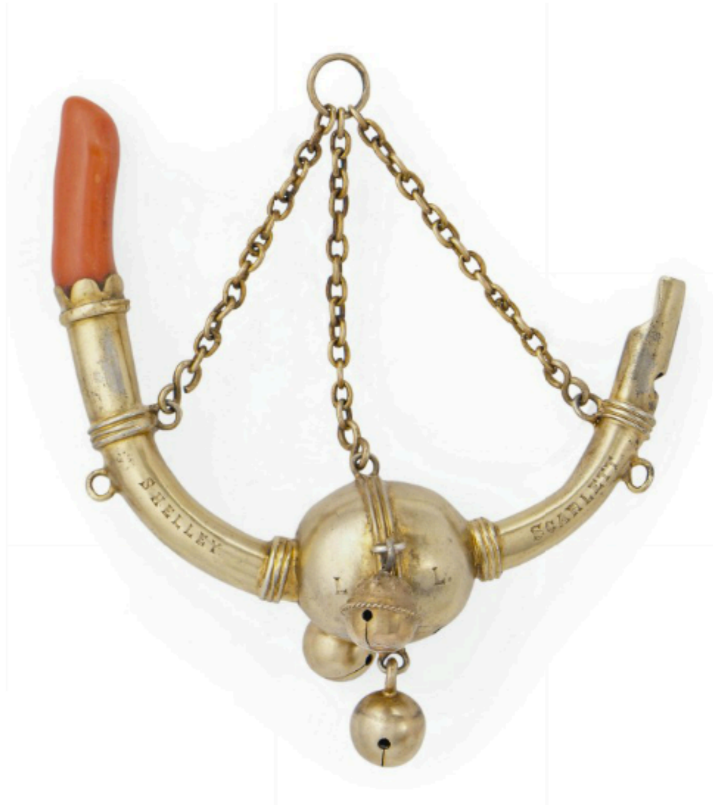
Silver & Coral Baby Rattle & Teether with Whistle & Bells Inscribed "SHELLEY SCARLETT"