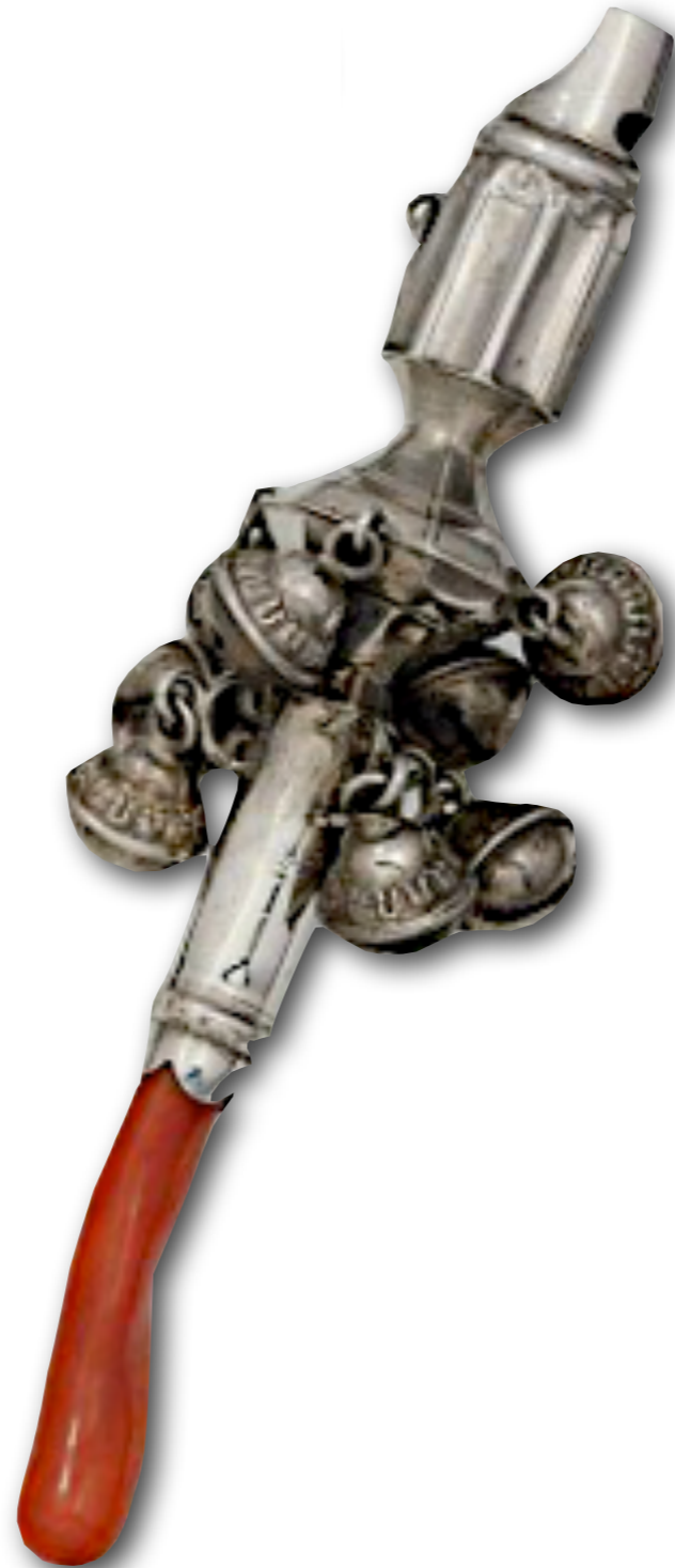
English Silver & Coral Baby Rattle & Teether with Whistle & Bells Mid 18th Century (Christie's)