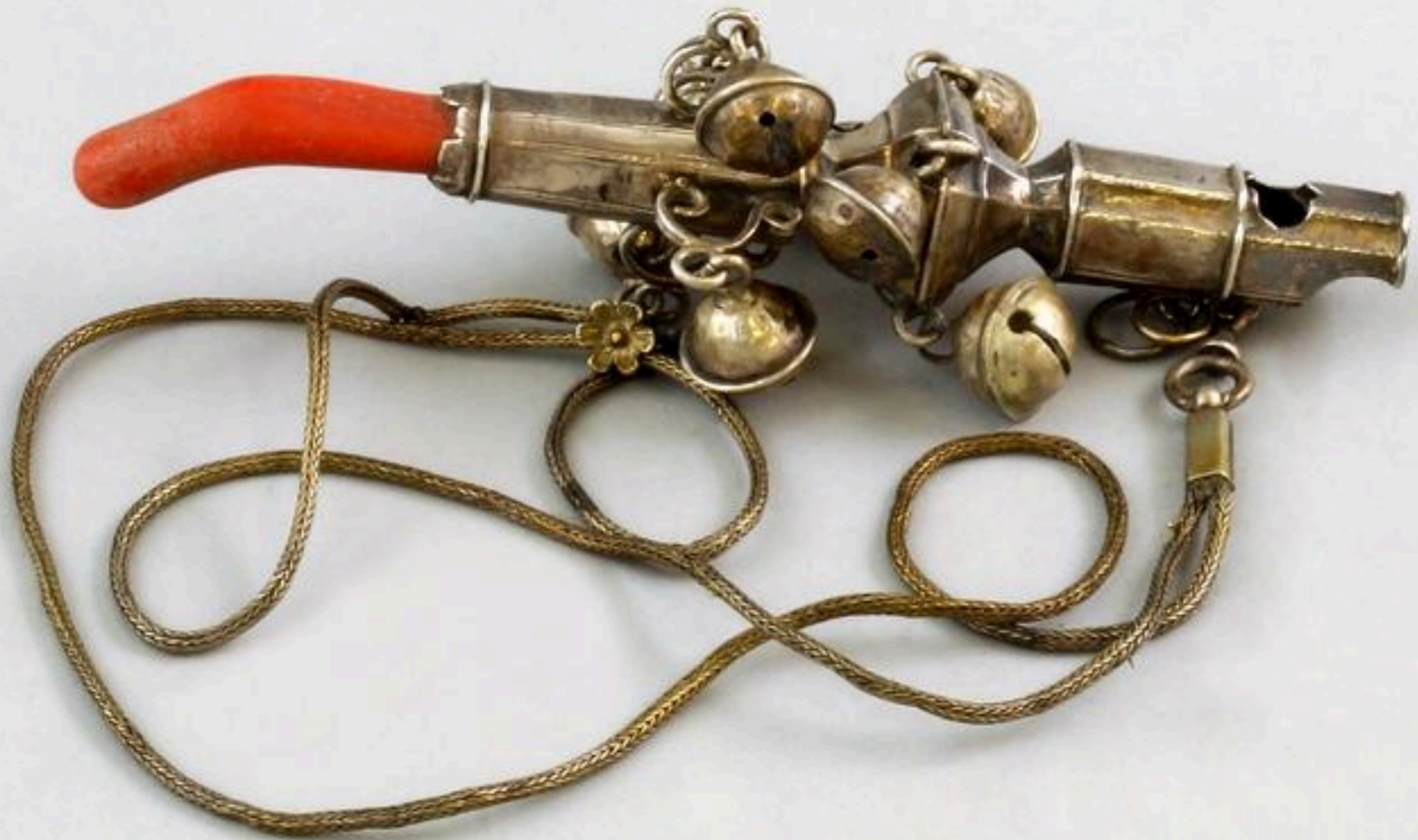
Silver & Coral Baby Rattle & Teether with Whistle & Bells Dated 1745 and Initialed "I.R.I.R.C." (Rosebery's London)