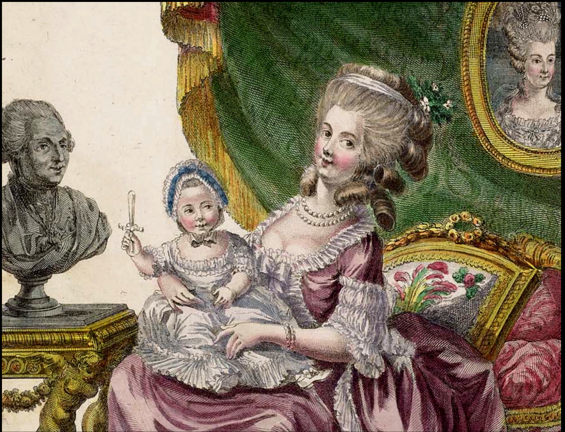
“Madame, Fille unique du Roi...” by Pierre Thomas LeClerc 1781 (Museum of Fine Arts, Boston)