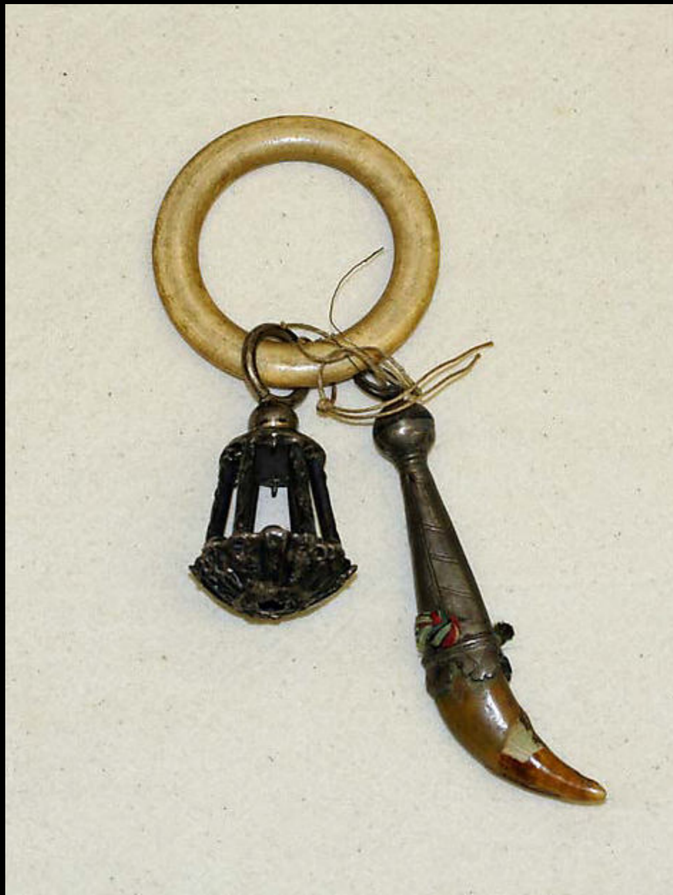
European Ivory & Metal Baby Rattle & Teether Late 18th - Early 19th Century (Metropolitan Museum of Art)