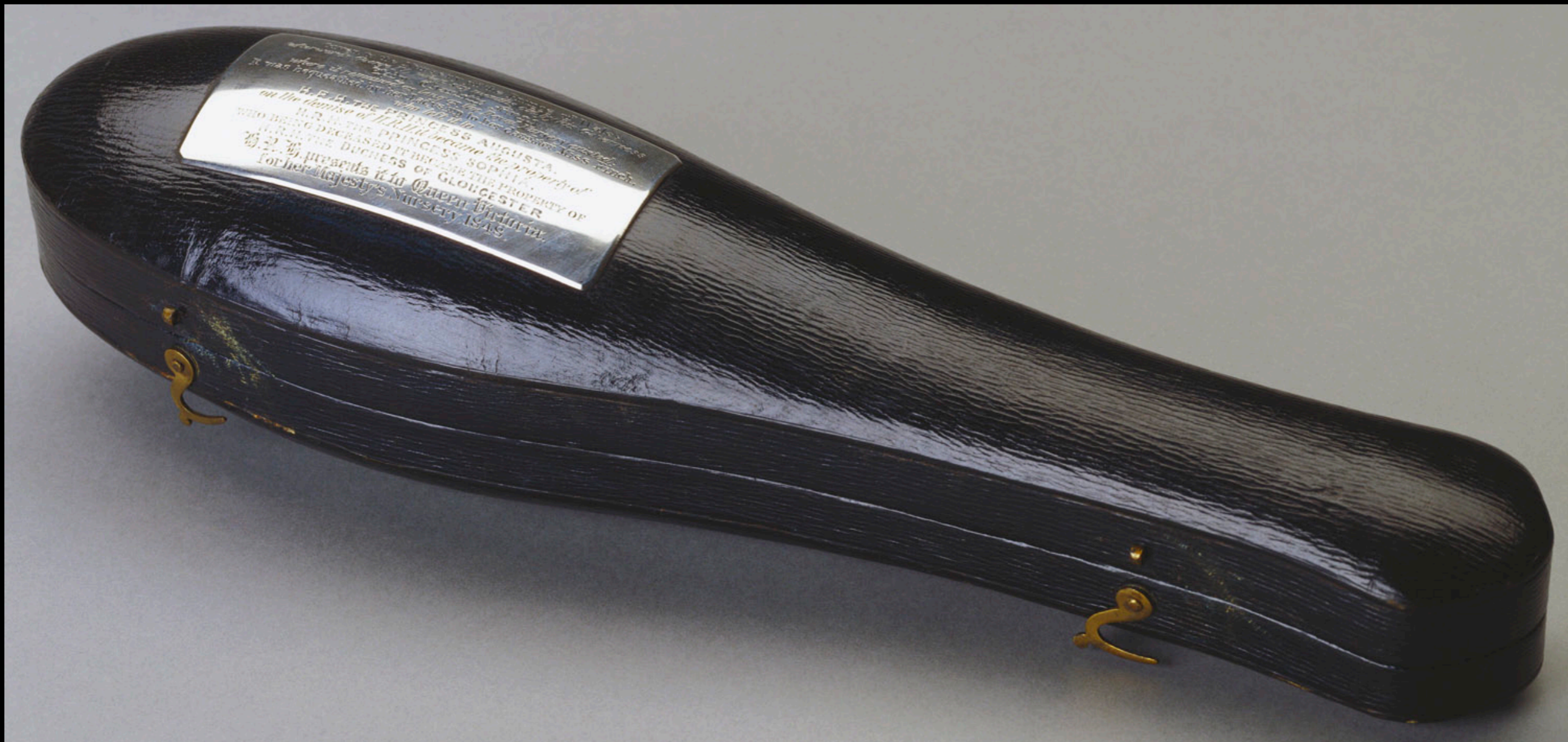
English Silver Filigree Rattle with Case Presented to the Royal Nursery by Lady Charlotte Finch 1763 (The Royal Collection)