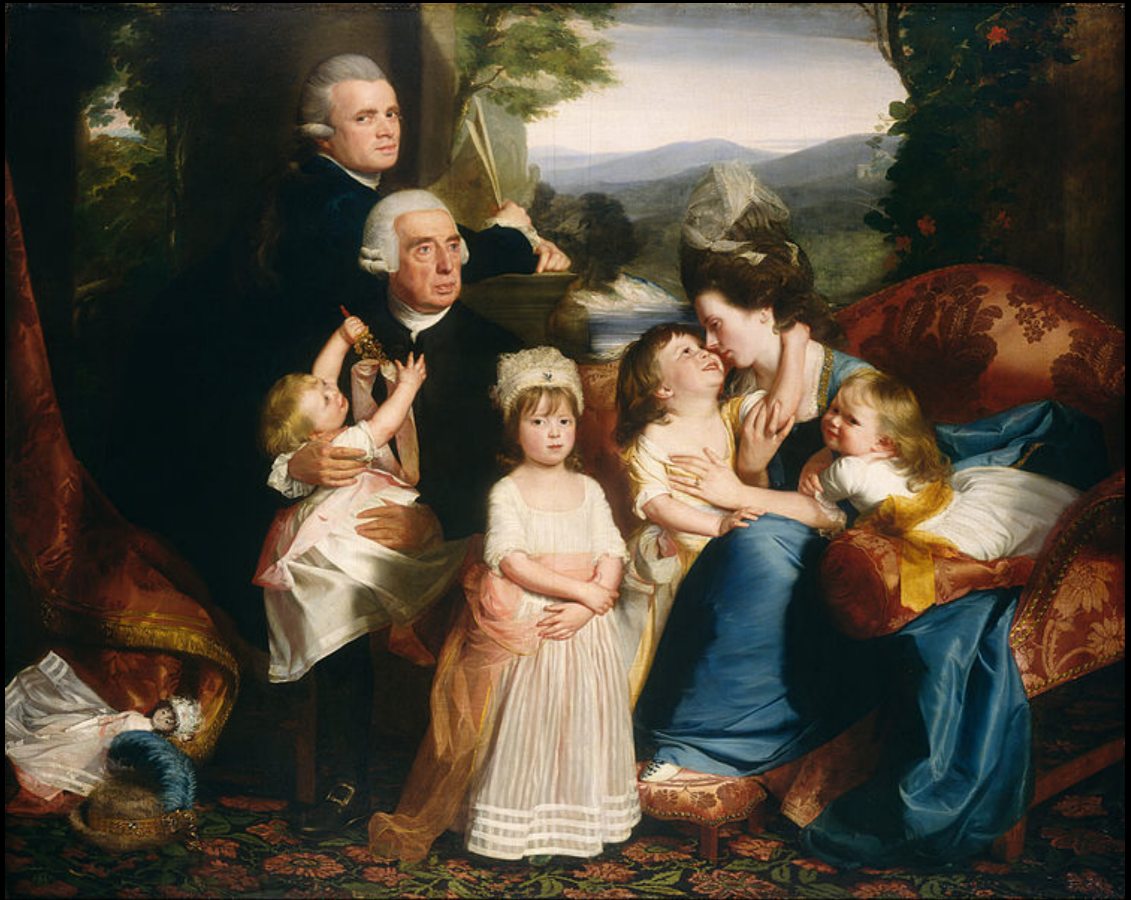
The Copley Family by John Singleton Copley c. 1776 - 1777 (National Gallery of Art)