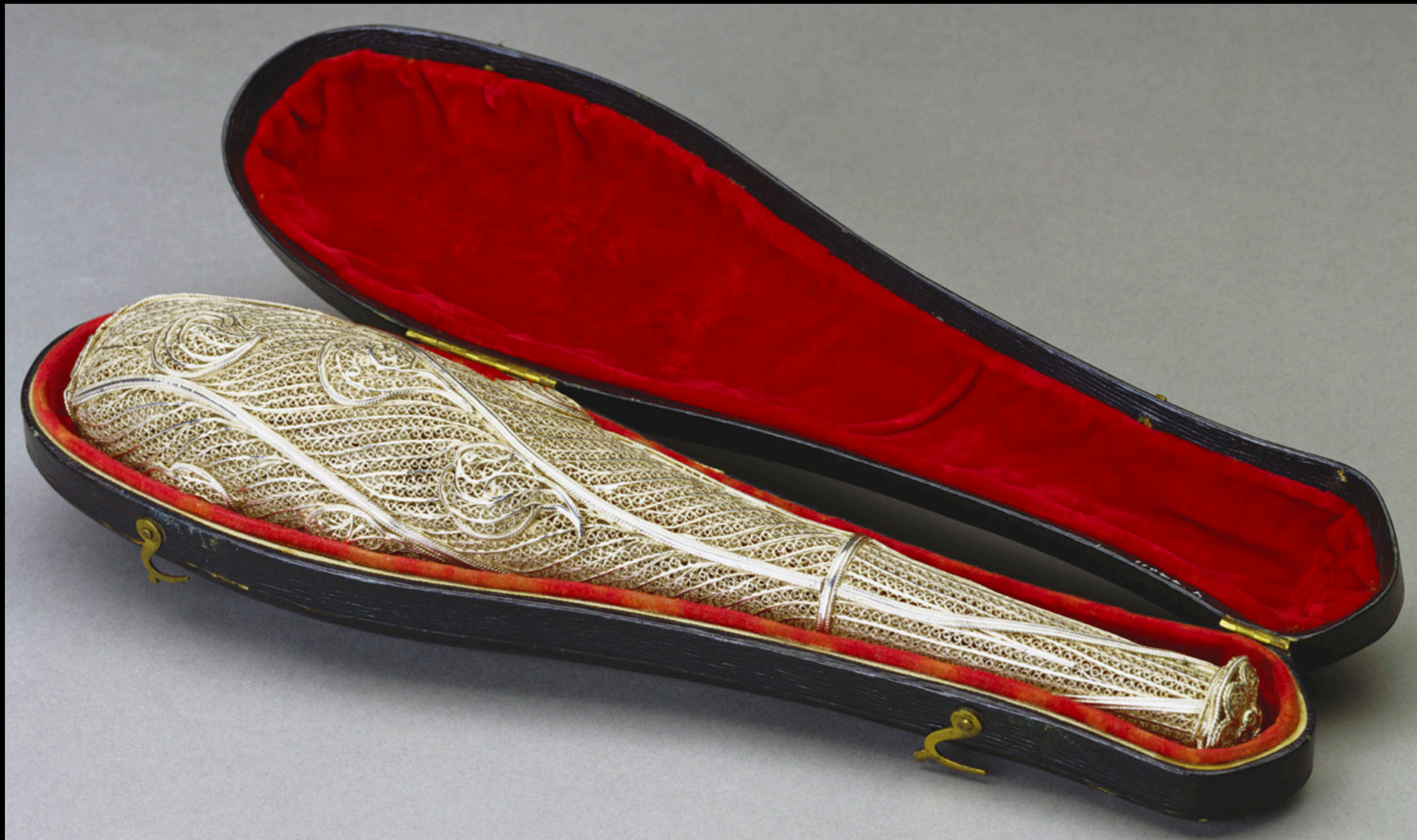
English Silver Filigree Rattle with Case Presented to the Royal Nursery by Lady Charlotte Finch 1763 (The Royal Collection)