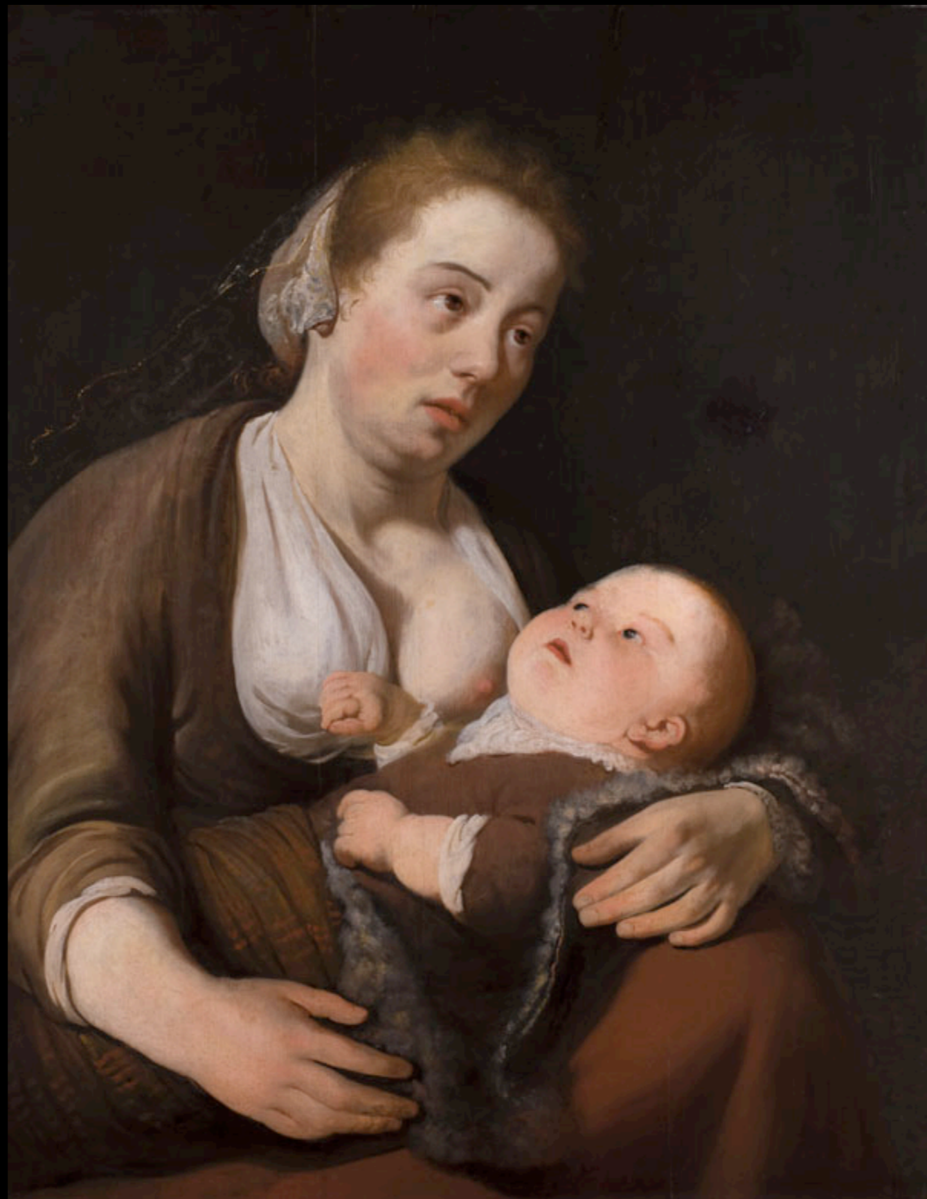
Dutch Mother with Child Jan van Bylert 17th Century (Hampell Auctions)