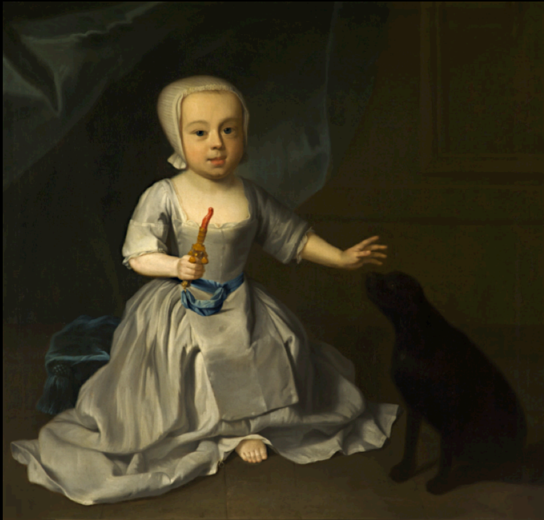
Possibly George Grey, Lord Grey of Groby Painted for Enville Hall c. 1740 (National Trust - Dunham Massey, Cheshire, North West)