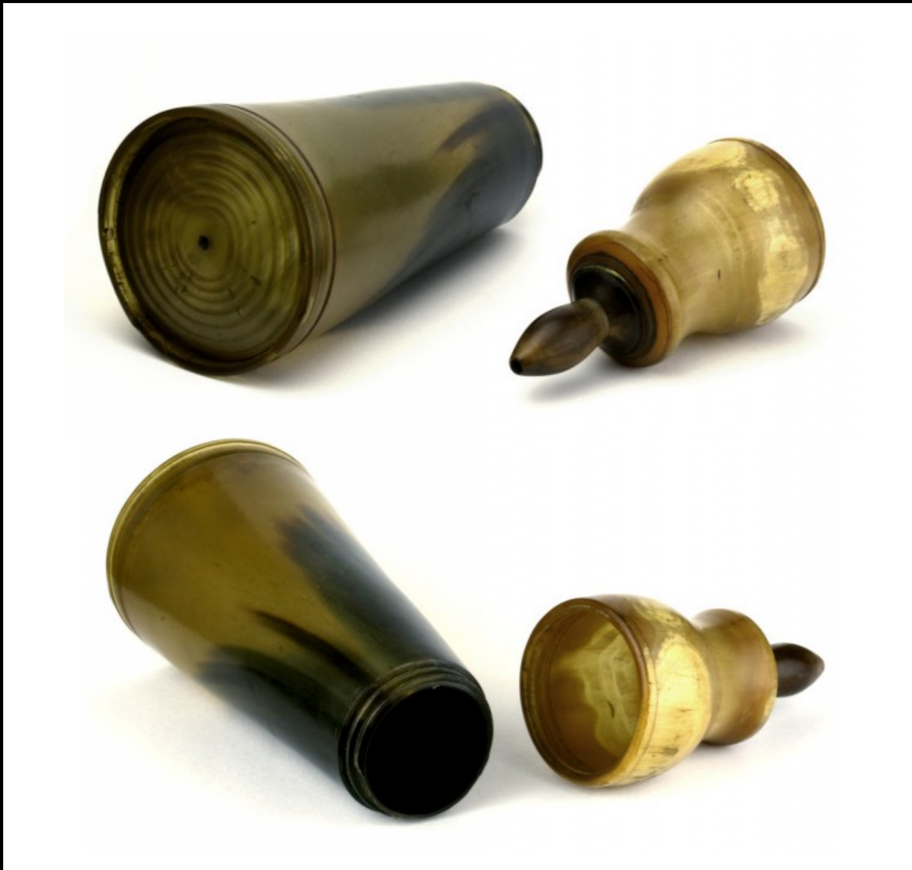
Horn Baby Feeder 18th Century