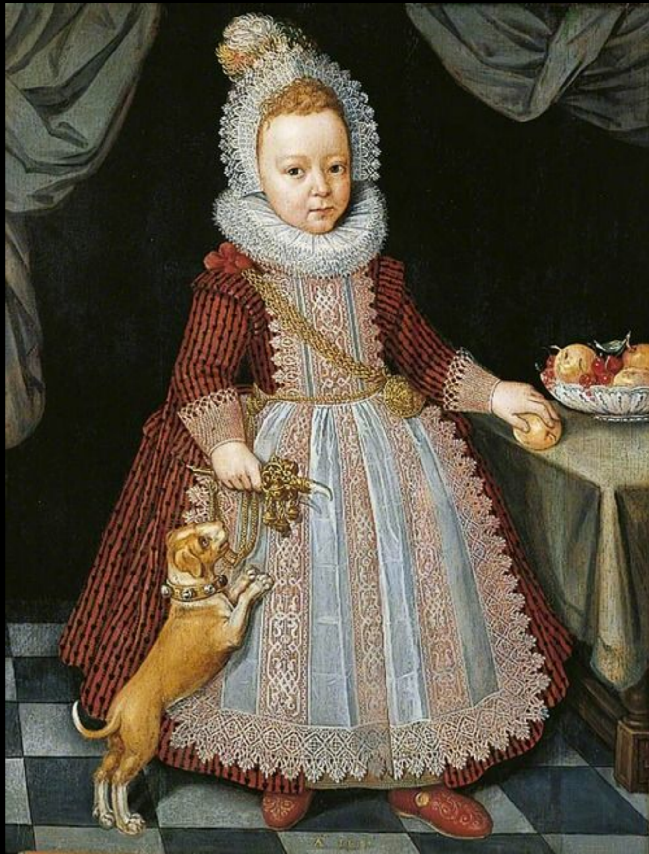
Lord Arundel by Paulus van Somer c. 1577 (Temple Newsam House)