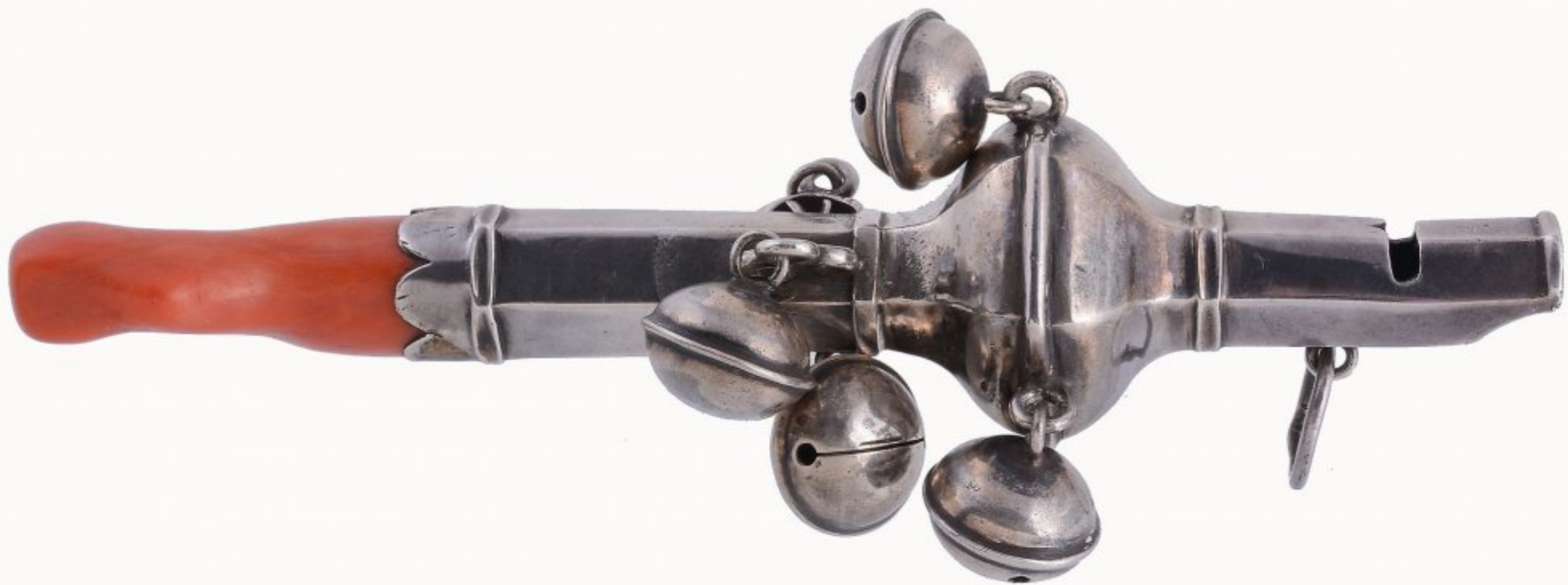
Silver & Coral Baby Rattle & Teether with Whistle & Bells Mid 18th Century (Dreweatts & Bloomsbury Auctions)