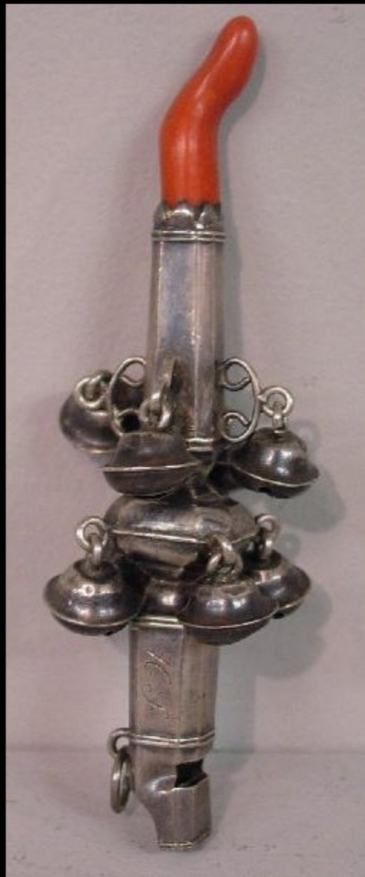
Silver & Coral Baby Rattle & Teether with Whistle & Bells 18th Century (Private Collection)