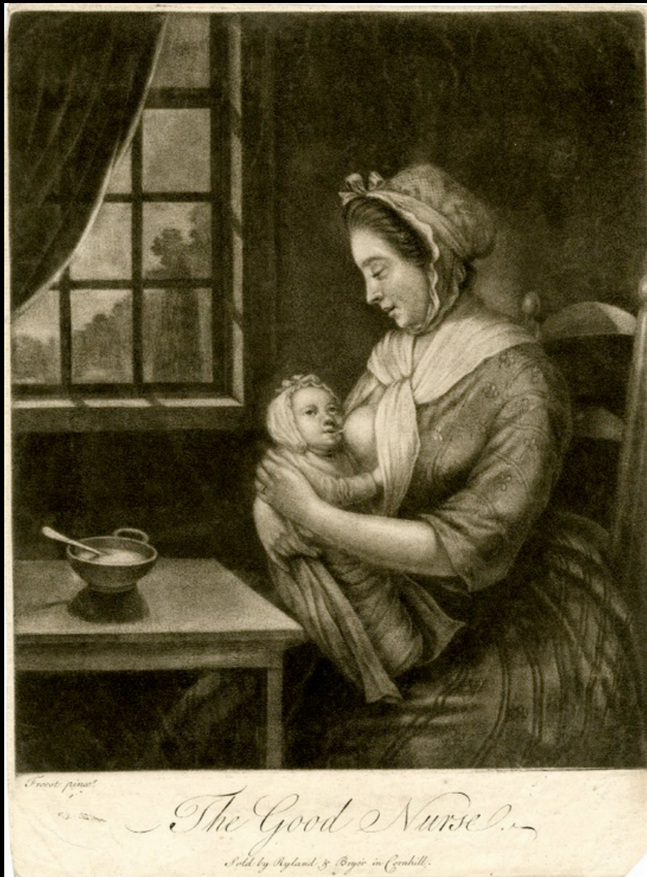
“The Good Nurse” by William Wynne Ryland after Cornelis Troost c. 1765 - 1771 (The British Museum)