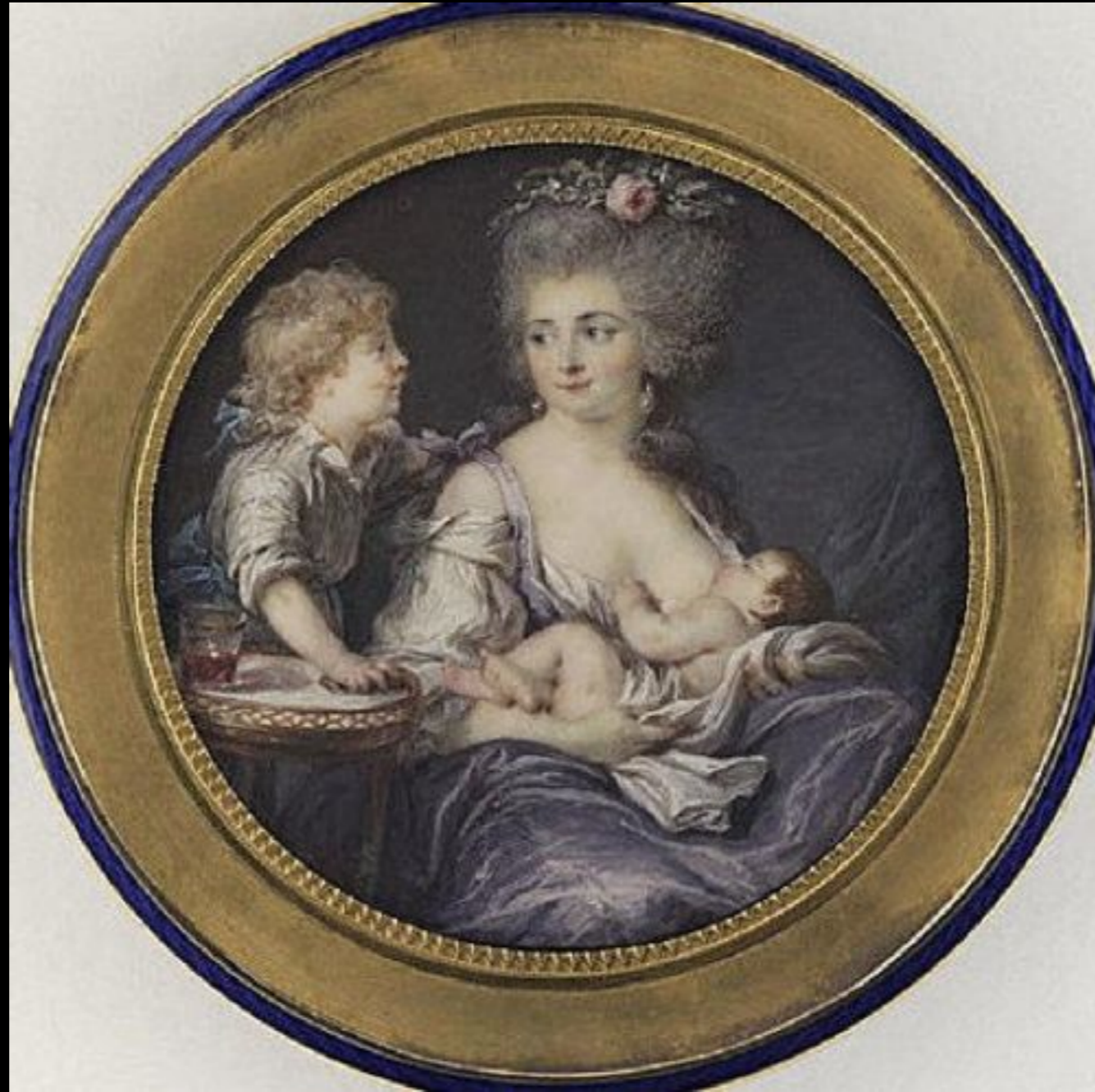
French Woman & Her Children by Adelaide Labille Guiard 1783 (Labille-Guiard)