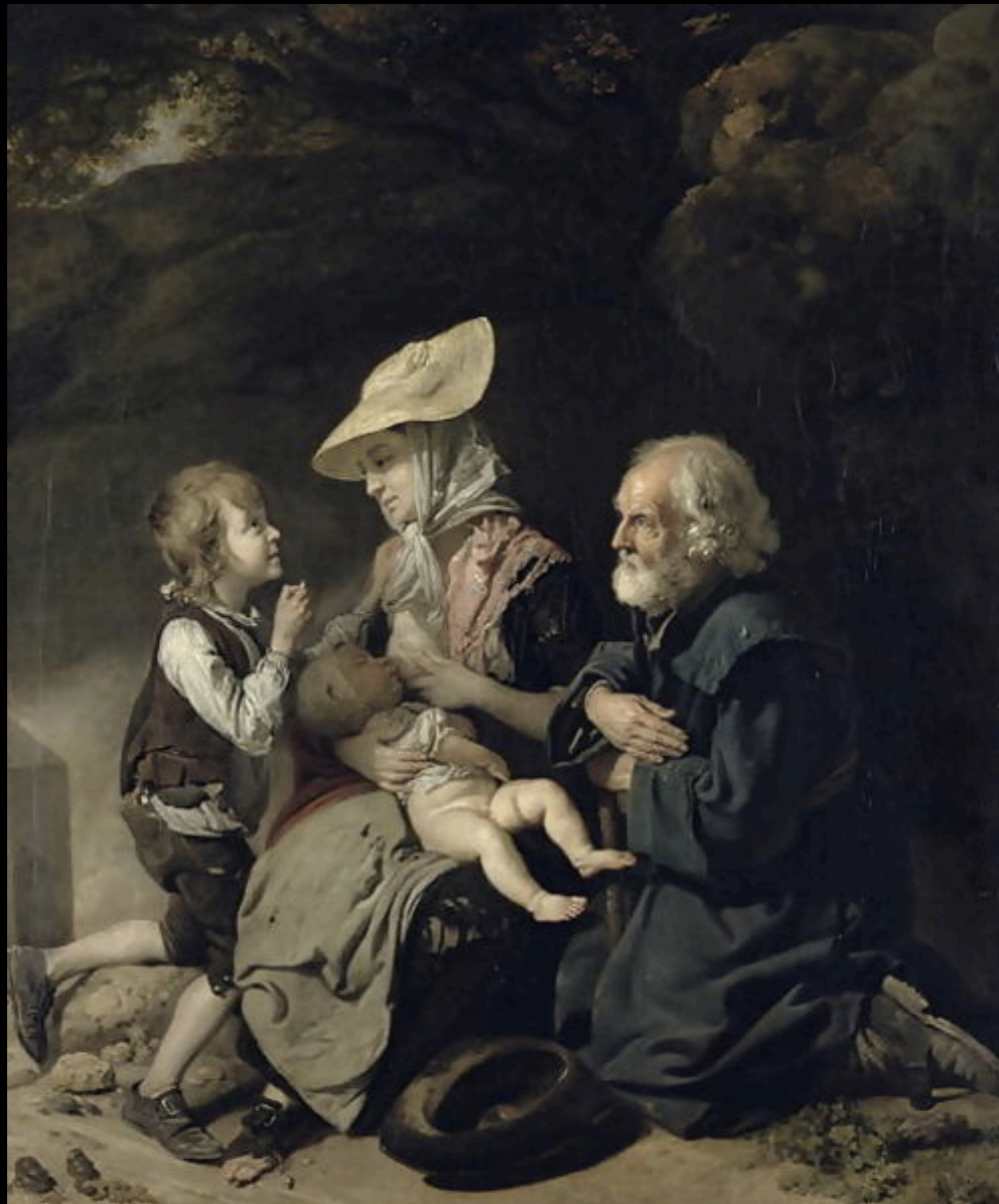
“Beggars on the Road to Stanmore” by Johann Zoffany (Private Collection)