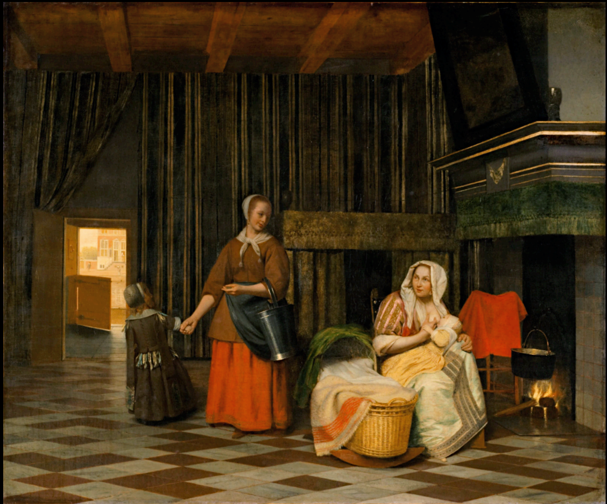
The Suckling Mother & Maid by Pieter de Hooch (Rotterdam c. 1670 - 1675 (Kunsthistorisches Museum)