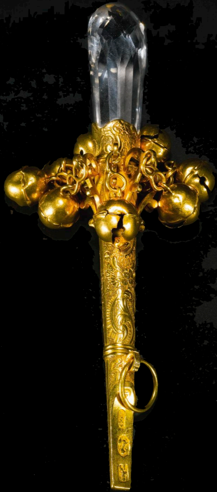
Dutch Gold & Rock Crystal Rattle from Amsterdam