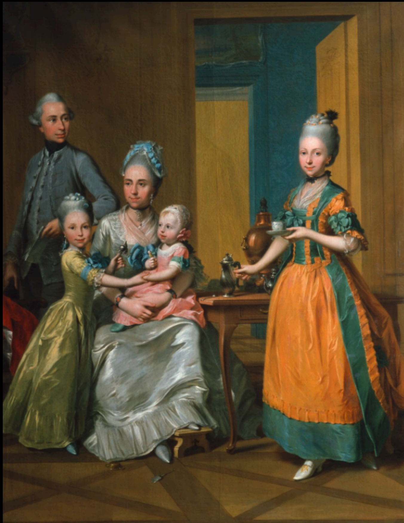
The Boris Family of Holland by Anton Wilhelm Tischbein c. 1770 - 1775 (Frankfurt Historical Museum)