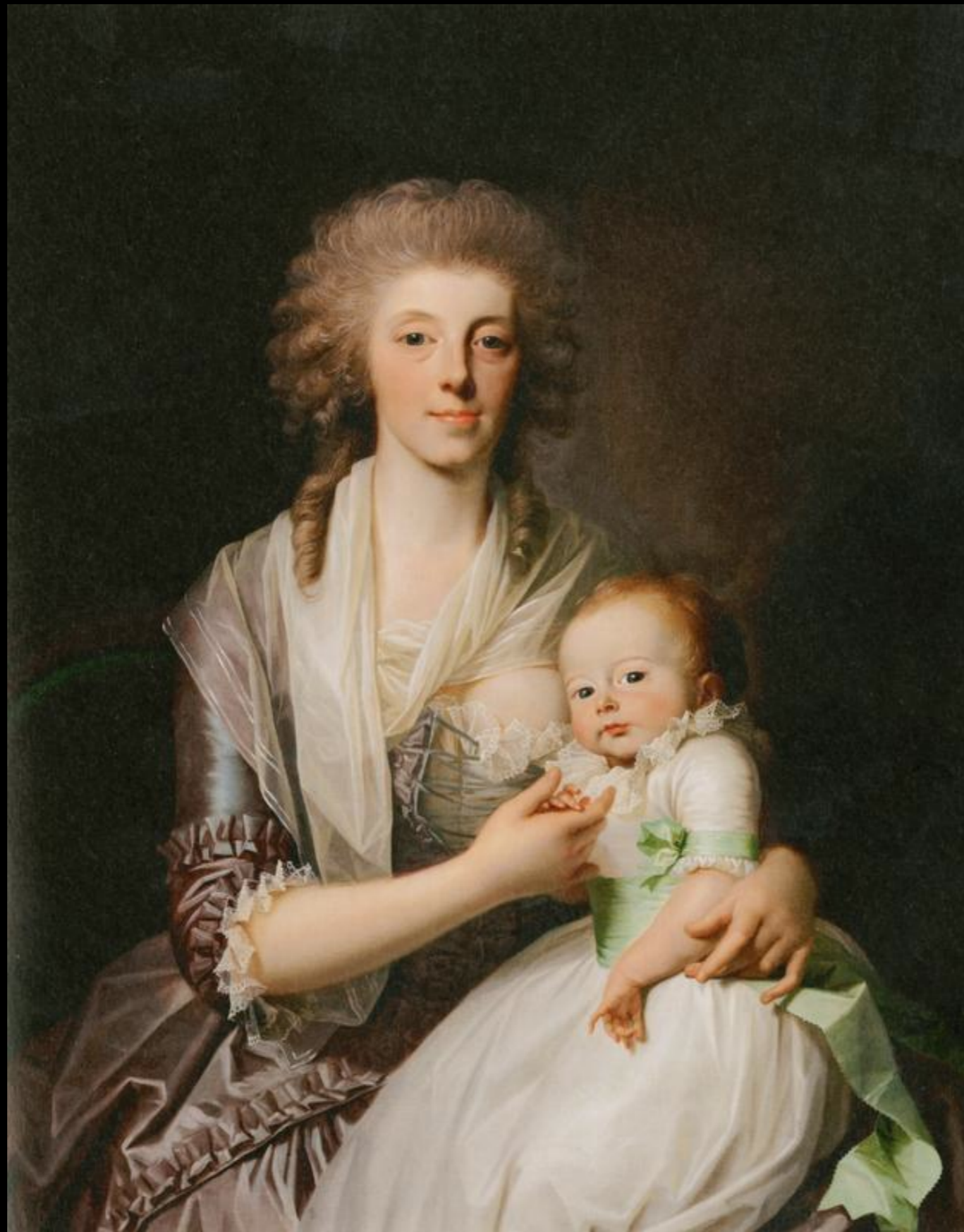
Countess Sophie Magdalene Raben by Jens Juel 1785 (Private Collection)