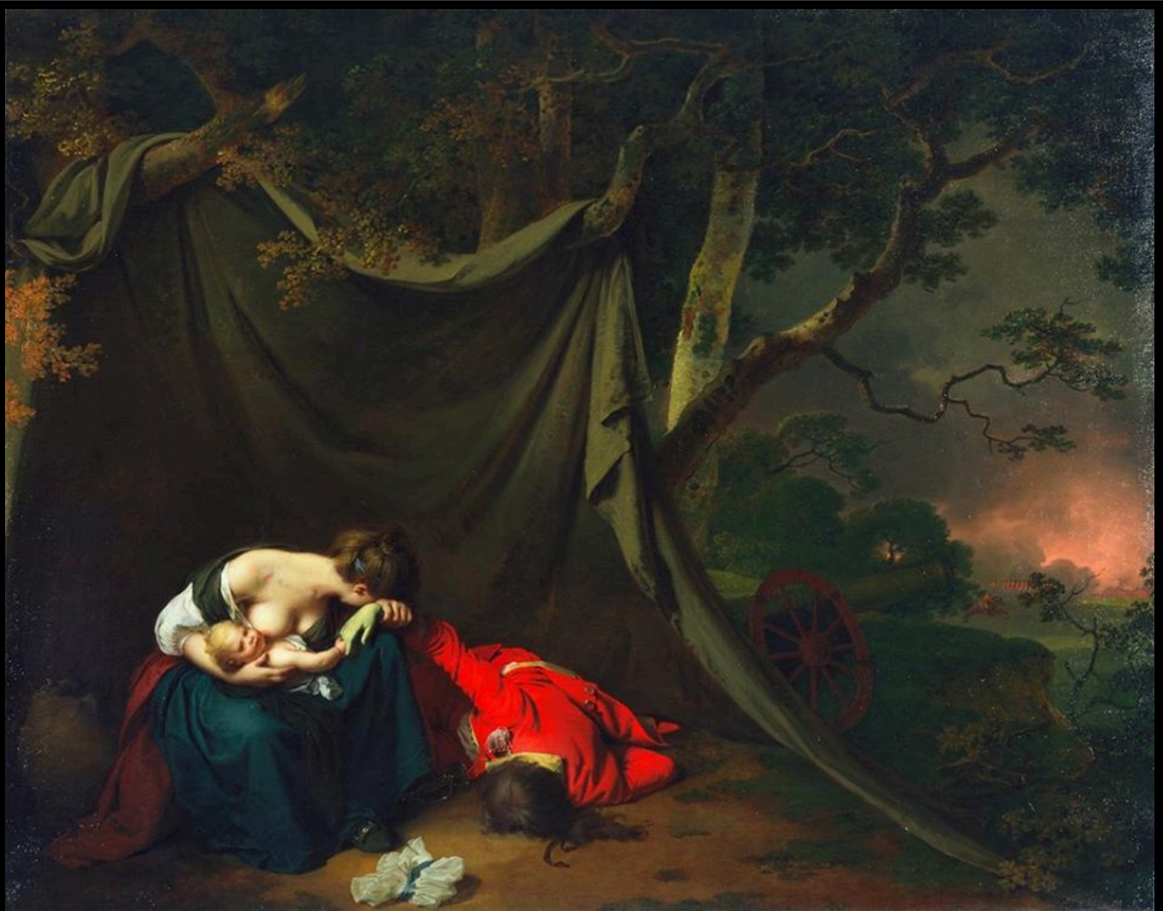
“Dead Soldier” by Joseph Wright of Derby 1789 (Fine Arts Museum - University of San Francisco)