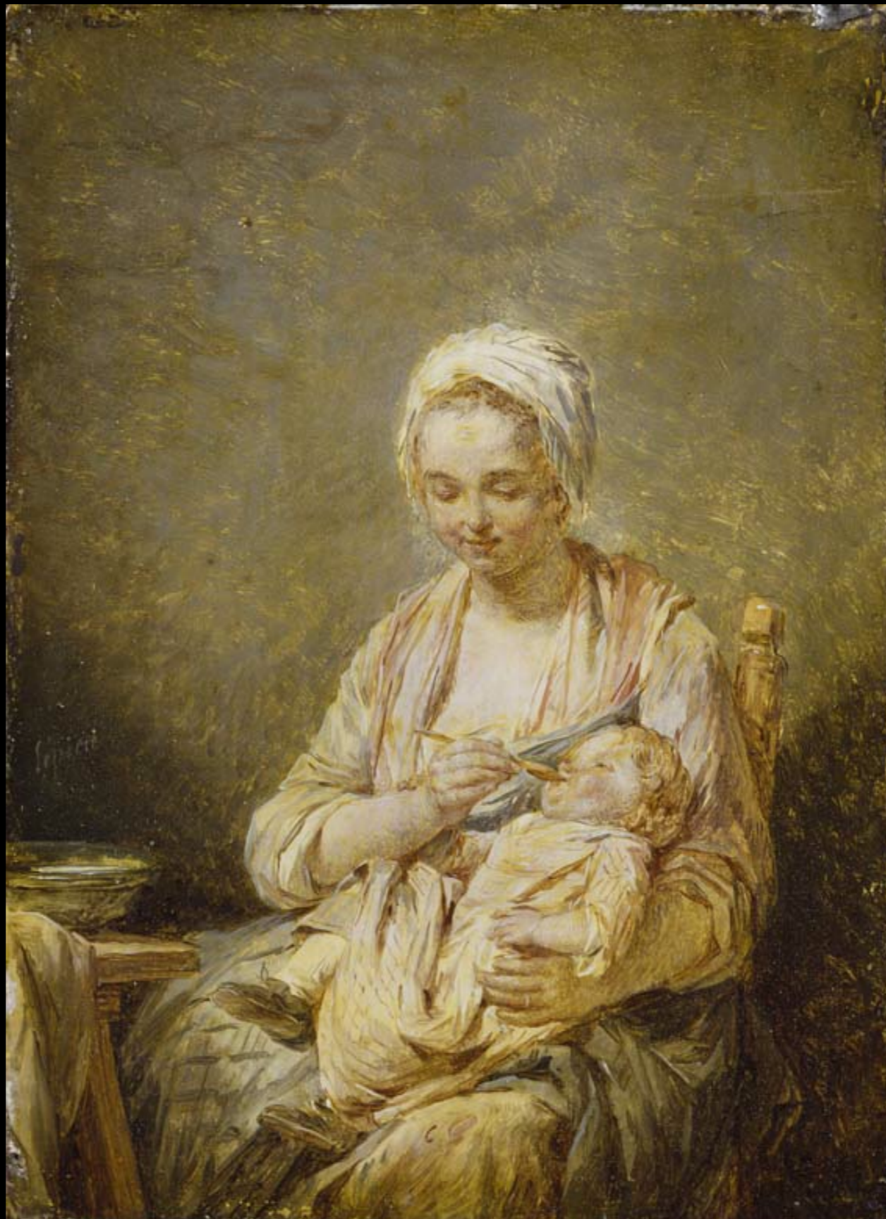
“Le devoir Maternel” (Maternal Duty) by Nicholas-Bernard Lepicie c. 1774 - 1779 (The Wallace Collection)