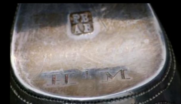
Silver & Coral Baby Rattle & Teether with Whistle & Bells 1793 (Antiques Roadshow)