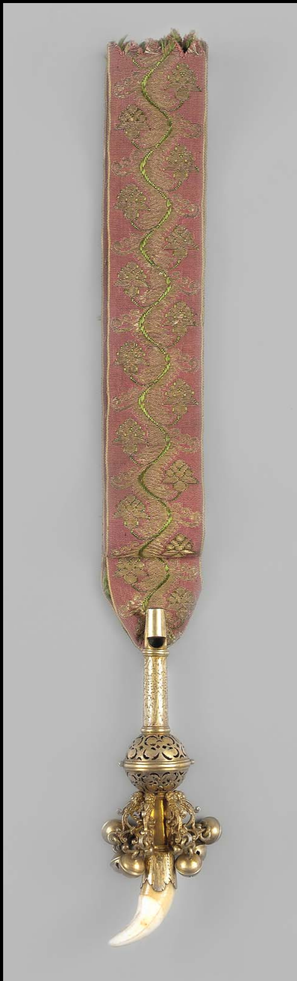
Baby Rattle & Teether with Whistle & Bells Mid 18th Century (Museum of Fine Arts, Boston)