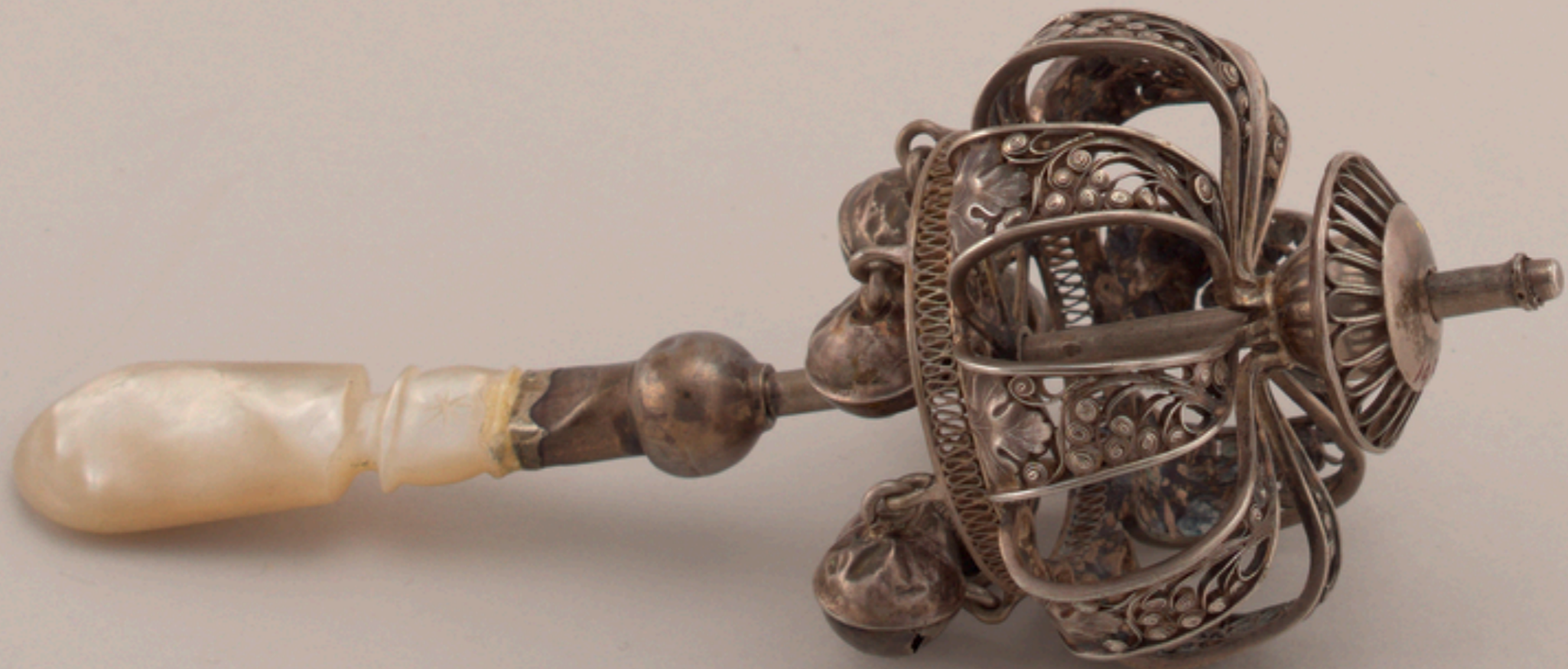
Silver & Mother of Pearl Rattle Late 18th Century (Cooper Hewitt - Smithsonian)