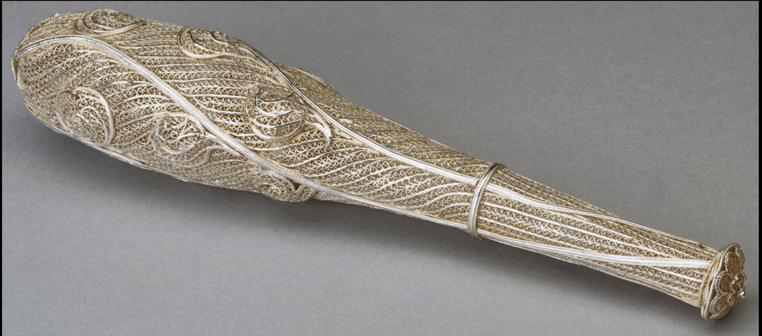
English Silver Filigree Rattle with Case Presented to the Royal Nursery by Lady Charlotte Finch 1763 (The Royal Collection)