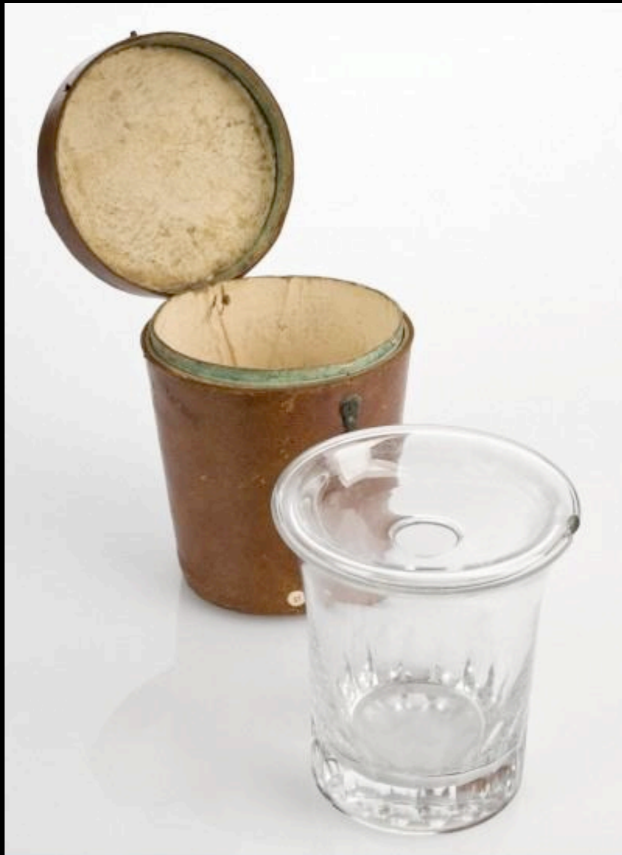
Breast Reliever or Breast Pump "tire-lait" 18th Century (Private Collection)