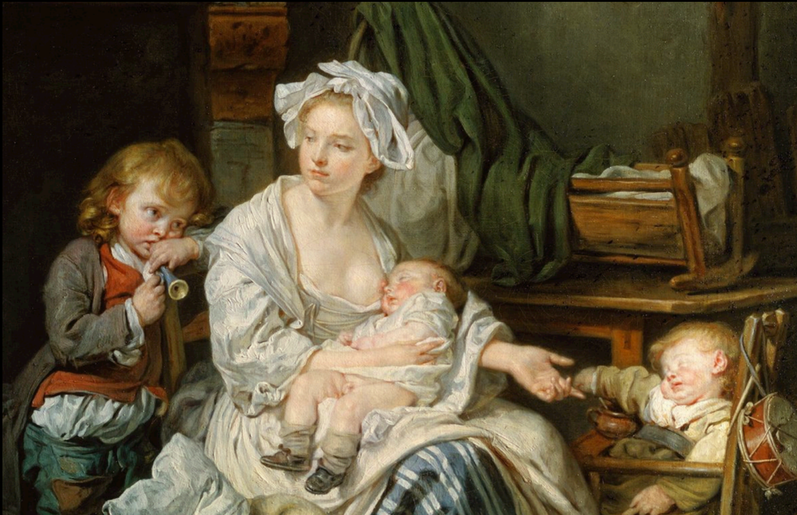
"Silence!" by Jean-Baptiste Greuze 1759 (The Royal Collection)