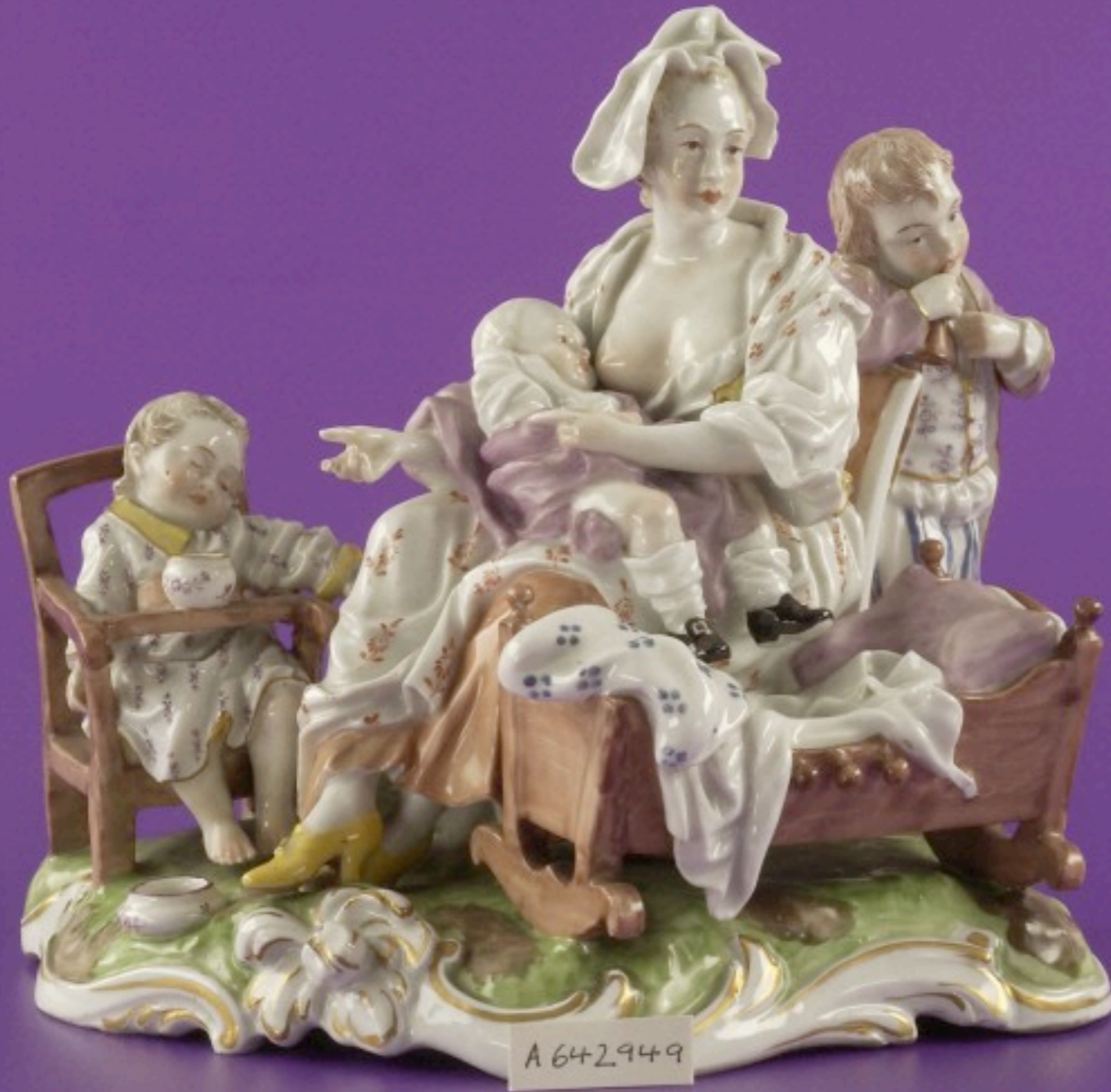
A Woman Breastfeeding a Baby 18th Century