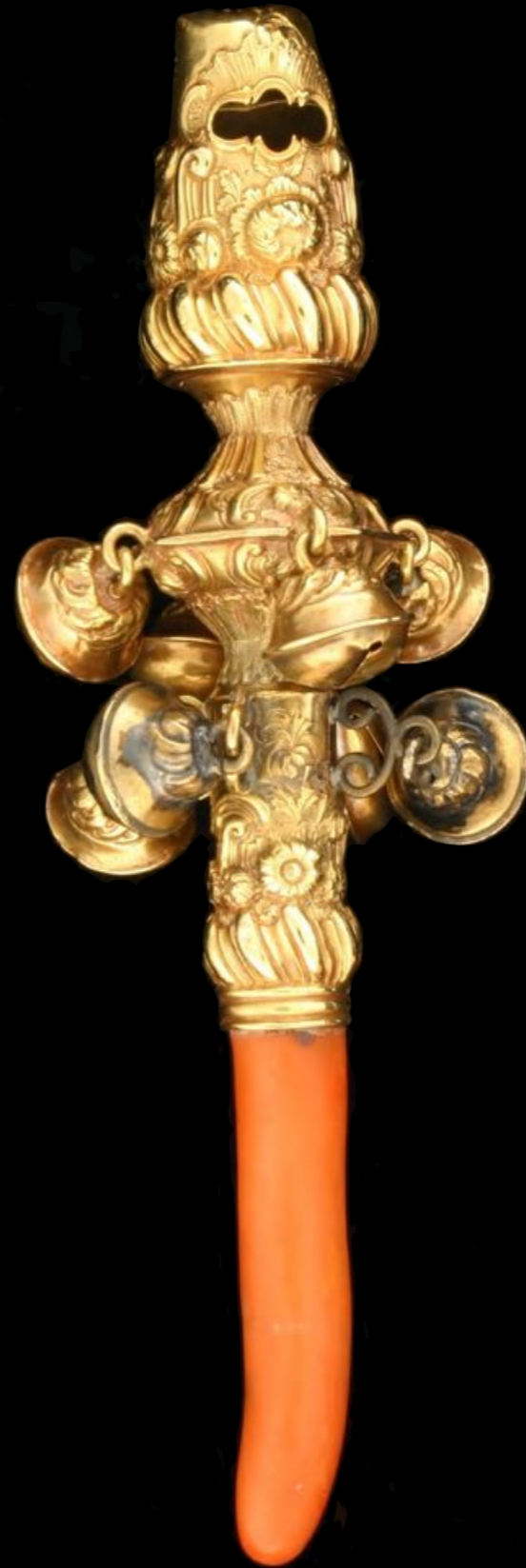
Gold & Coral Baby Rattle & Teether with Whistle & Bells c. 1760 - 1780 (The Henry Ford Costume Collection)