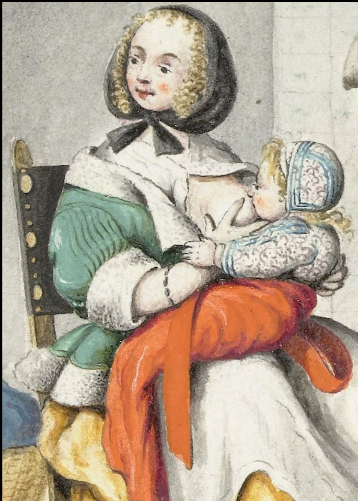
Nursery by Gesina ter Borch c. 1660 - 1661 (Rijksmuseum)