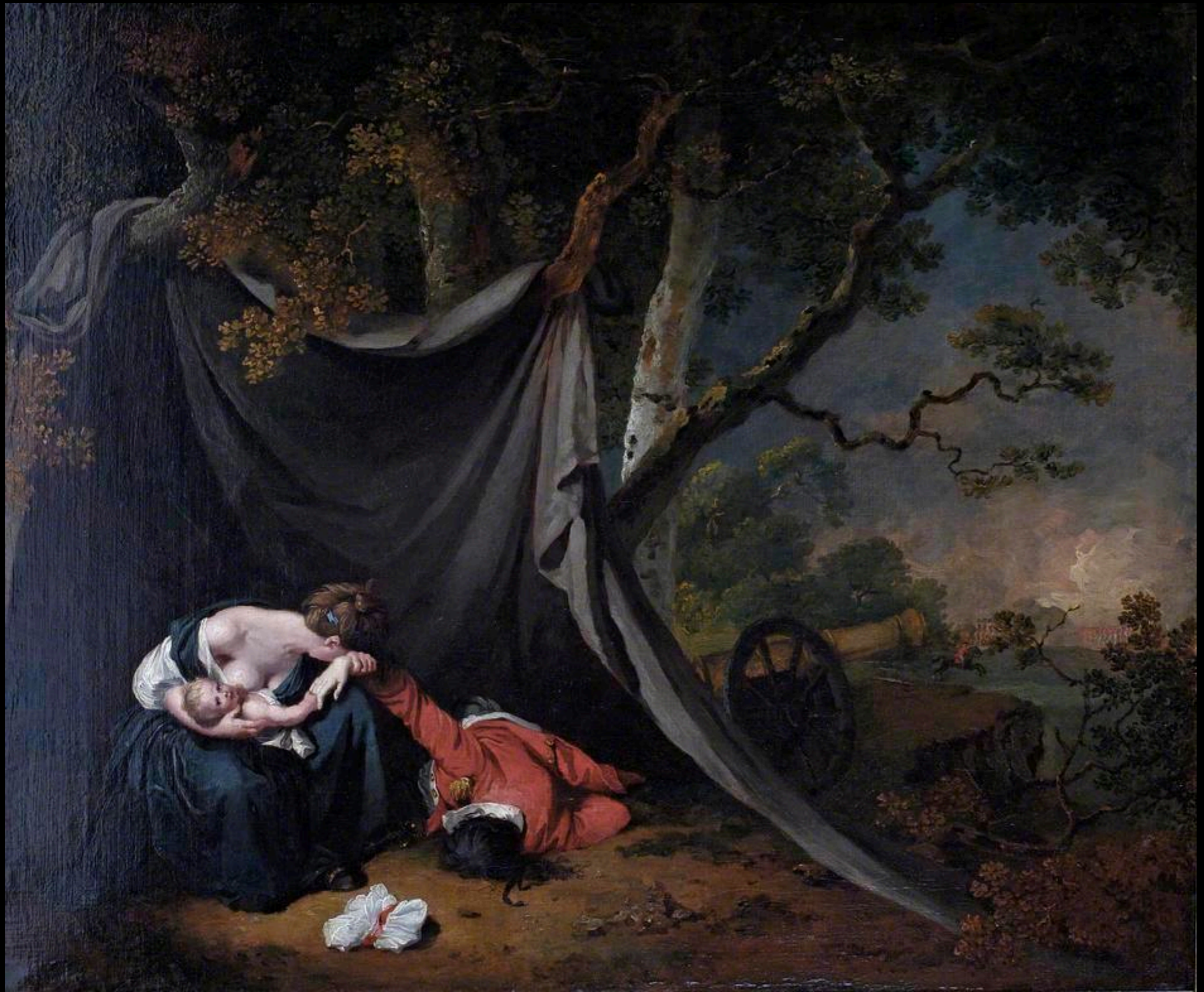
“Dead Soldier” after Joseph Wright of Derby 1789 (Holburne Museum)