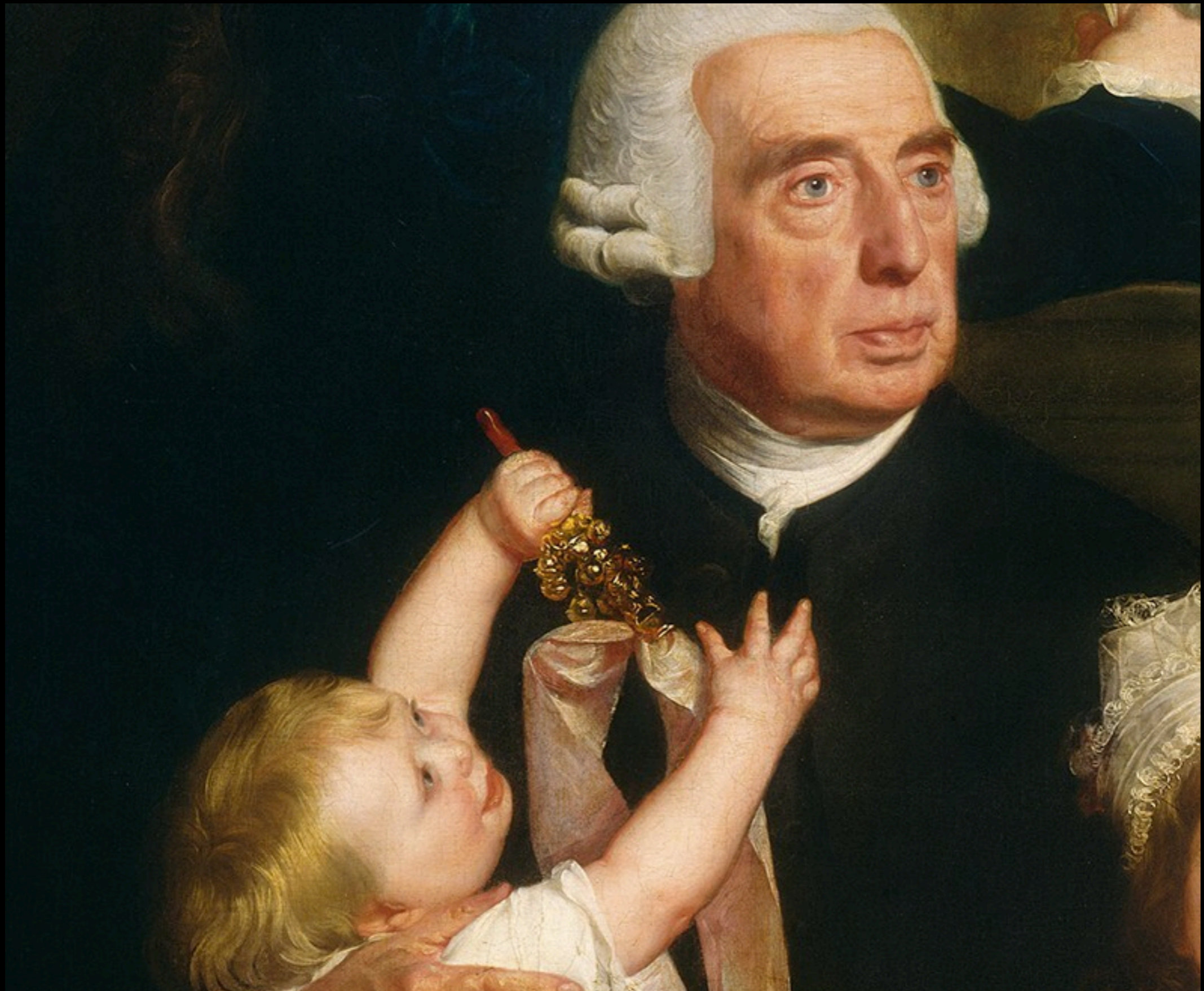
The Copley Family by John Singleton Copley c. 1776 - 1777 (National Gallery of Art)