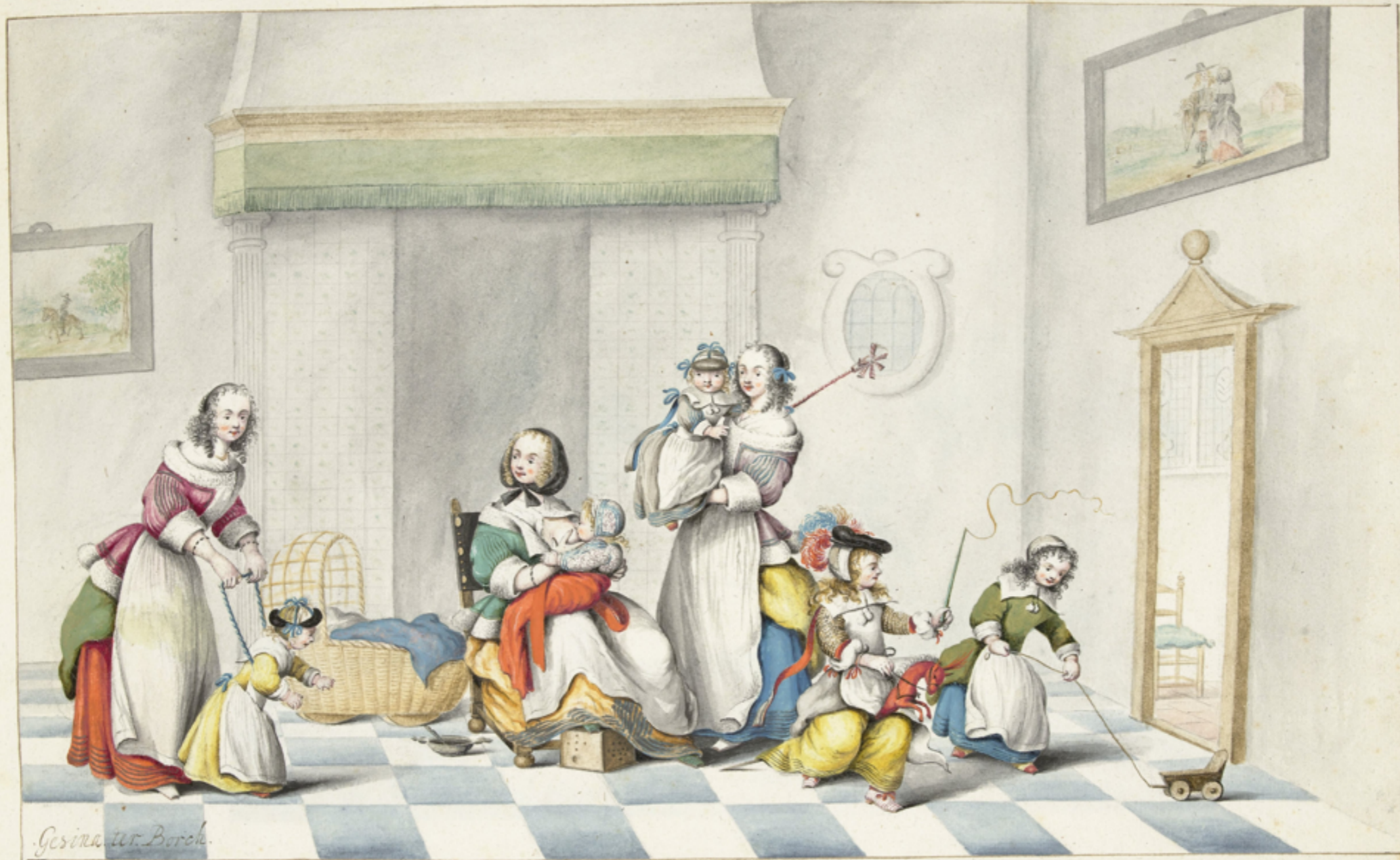
Nursery by Gesina ter Borch c. 1660 - 1661 (Rijksmuseum)