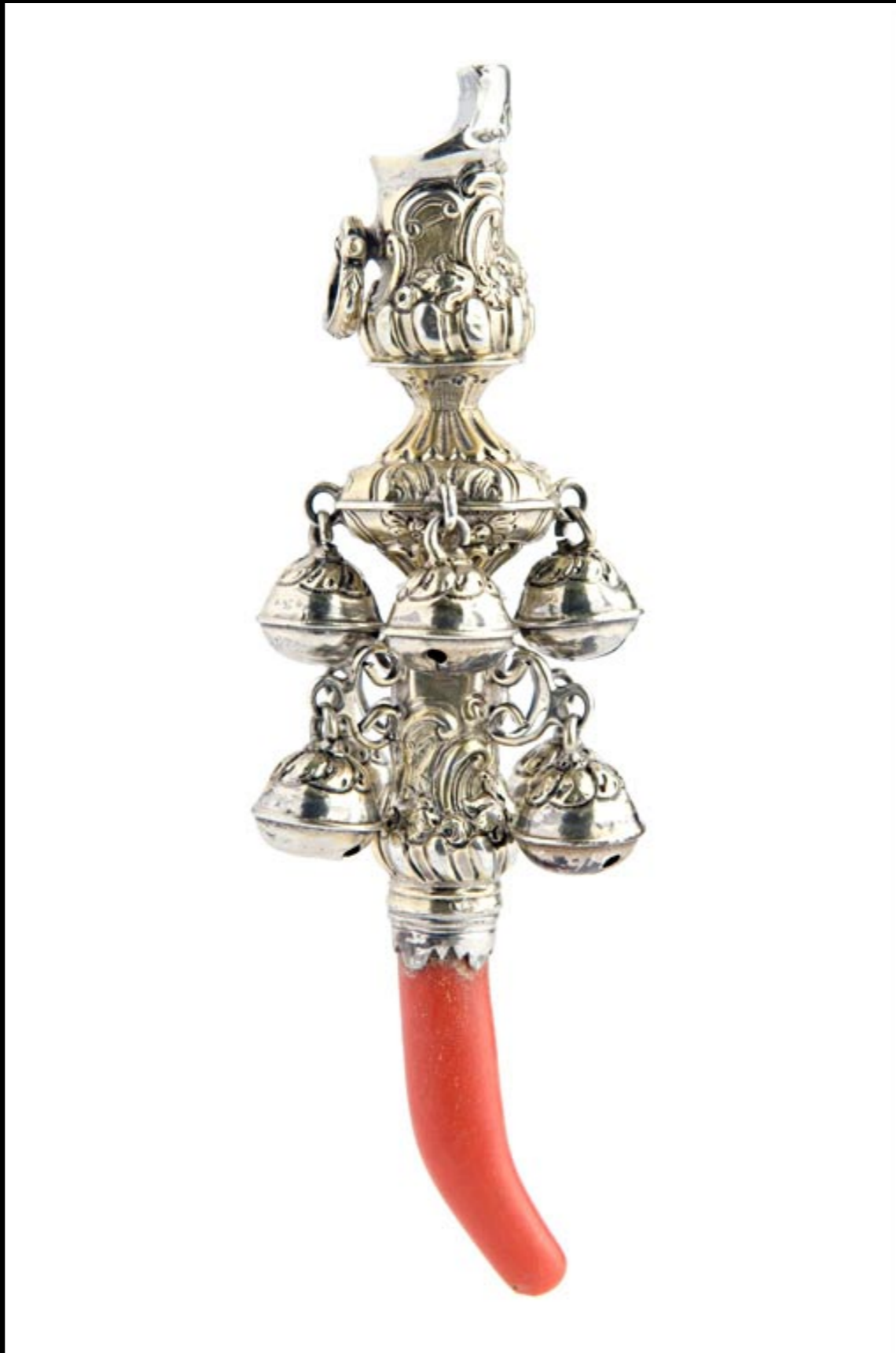
Silver & Coral Baby Rattle & Teether with Whistle & Bells