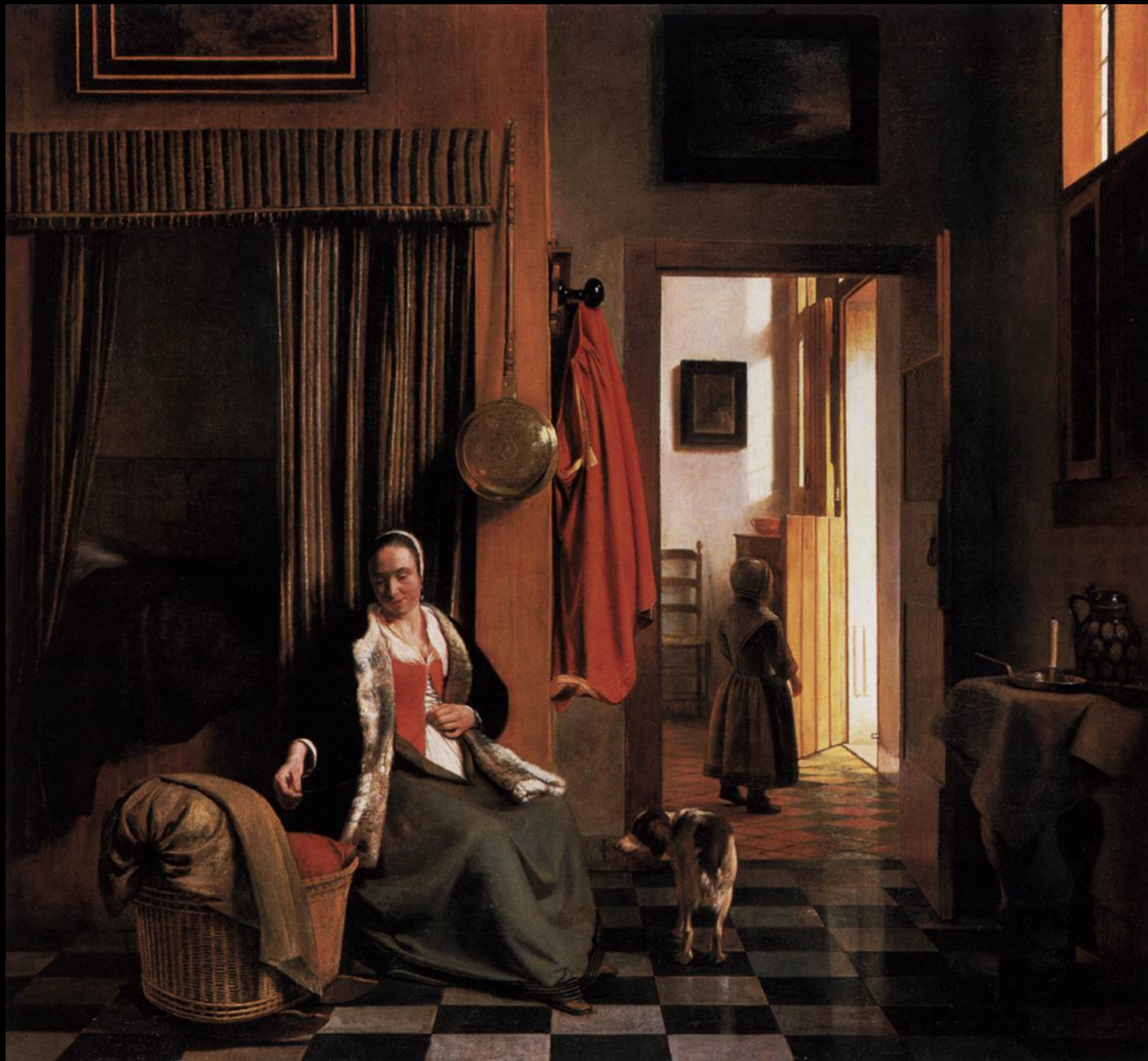
A Mother Lacing Up Her Bodice by Pieter de Hooch (Rotterdam c. 1659 -1660 (Staatliche Museen, Berlin)