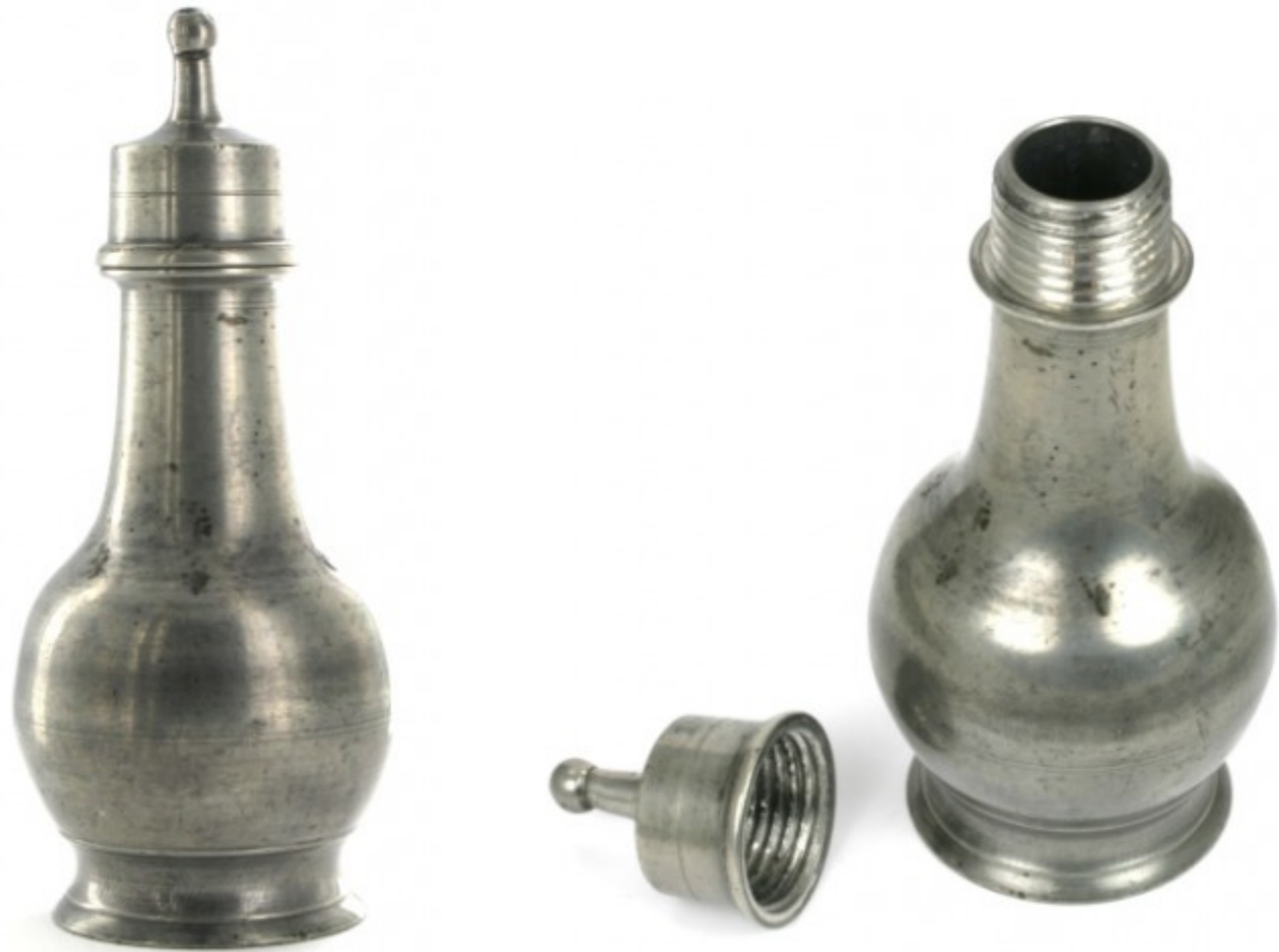
English Pewter Baby Feeder c. 1730 - 1750 (Phisick Medical Antiques)