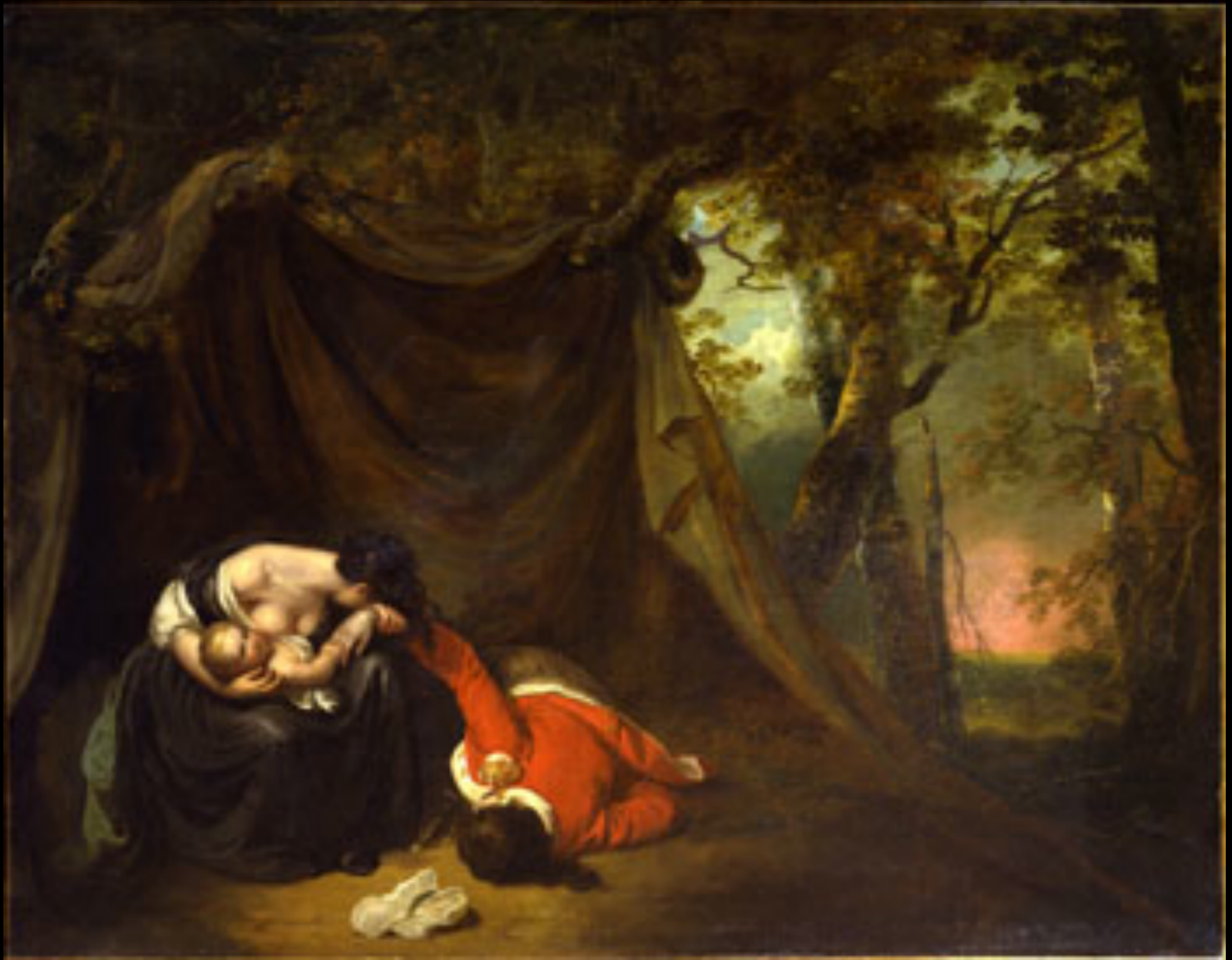
“Dead Soldier” after Joseph Wright of Derby 1789 (University of Michigan)