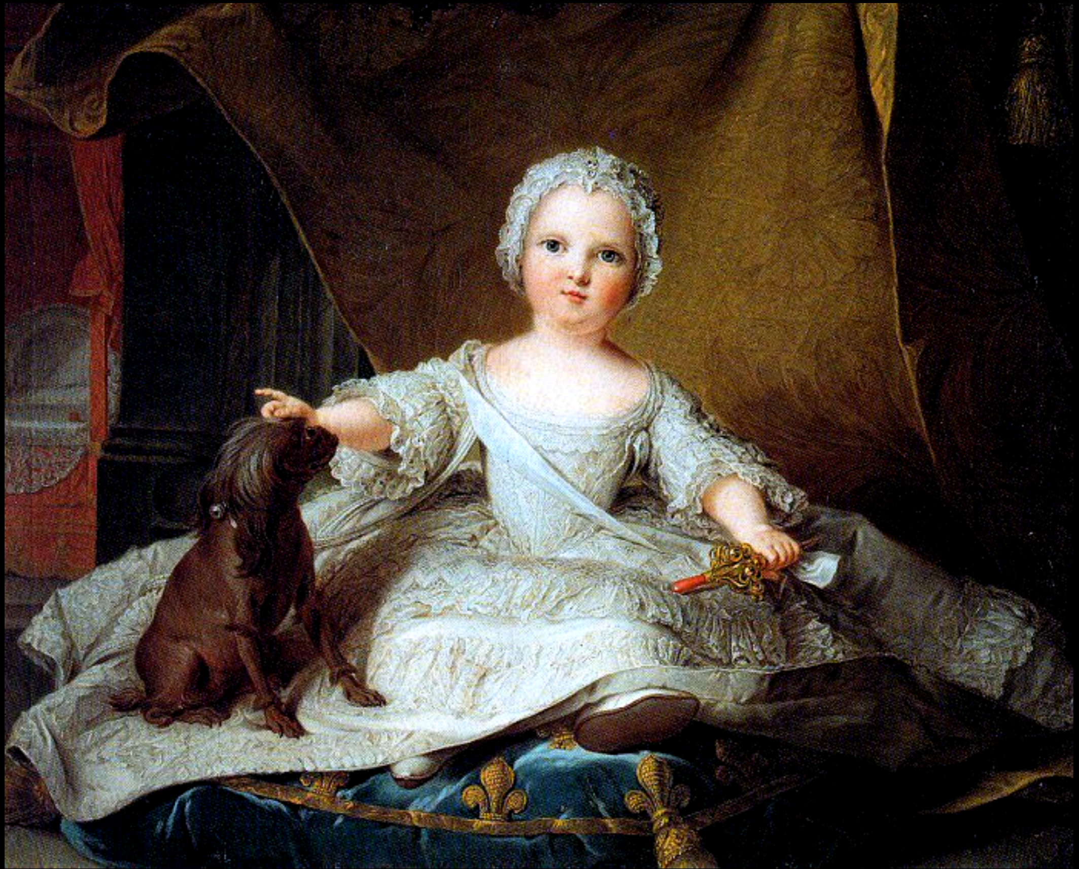
Princess Marie Zéphyrine of France (1750-1755) by Jean - Marc Nattier c. 1751 (Uffizi Gallery)