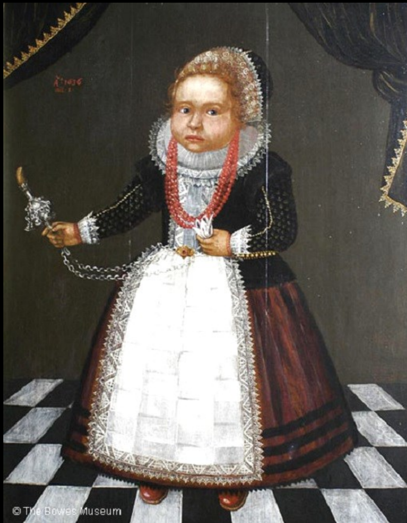
A Young European Girl 1636 (Bowes Museum)