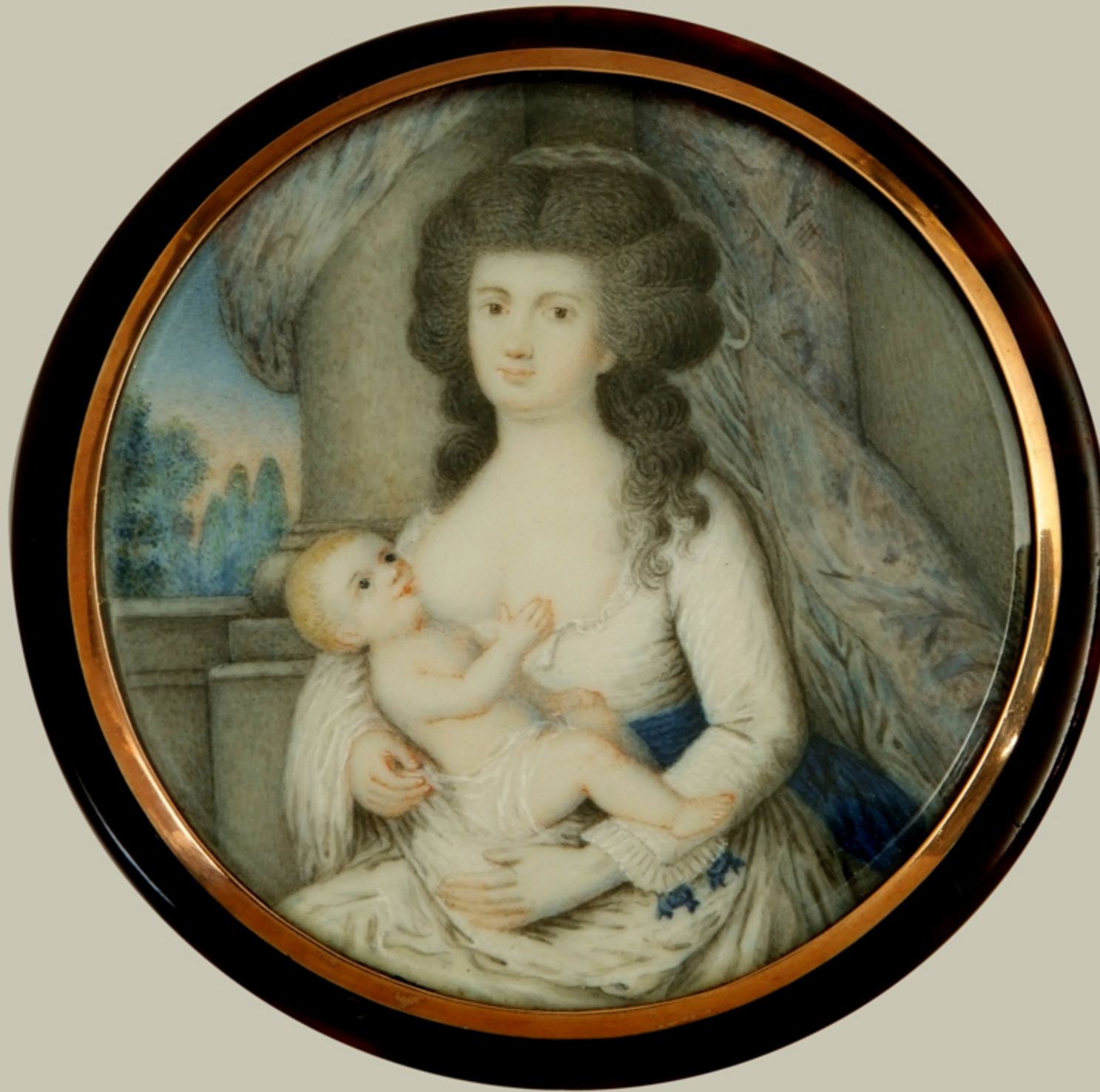
English Miniature Box Late 18th Century (Important Miniatures & Fine Art)