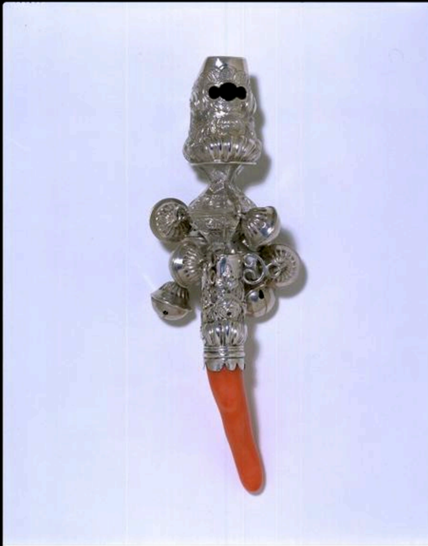
English Silver & Coral Baby Rattle & Teether with Whistle & Bells