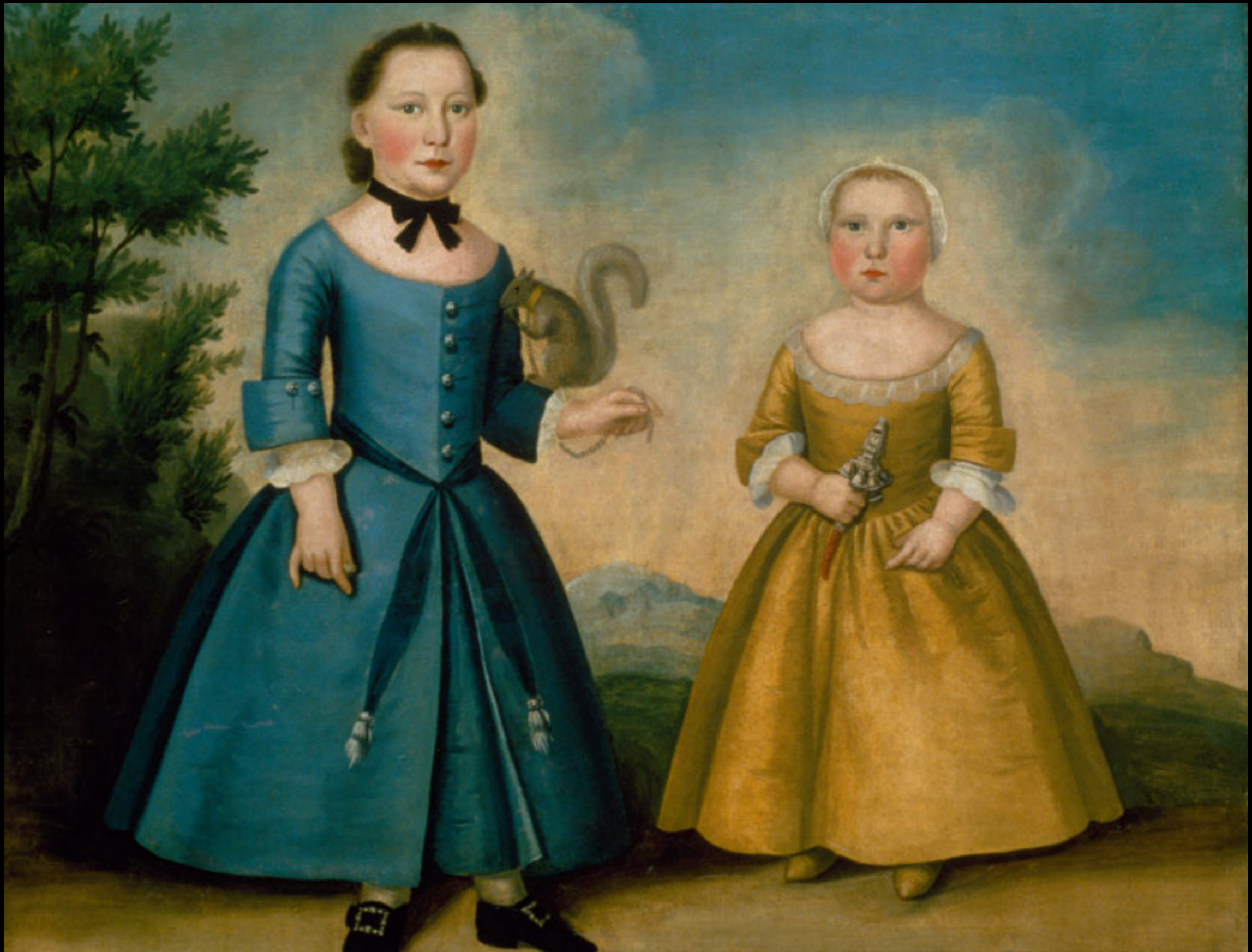
Portrait of Two Children, Likely from Boston, Massachusetts by Joseph Badger c. 1760