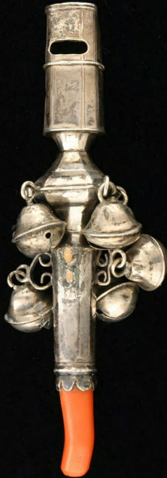
Silver & Coral Baby Rattle & Teether with Whistle & Bells c. 1785 (The Henry Ford Costume Collection)