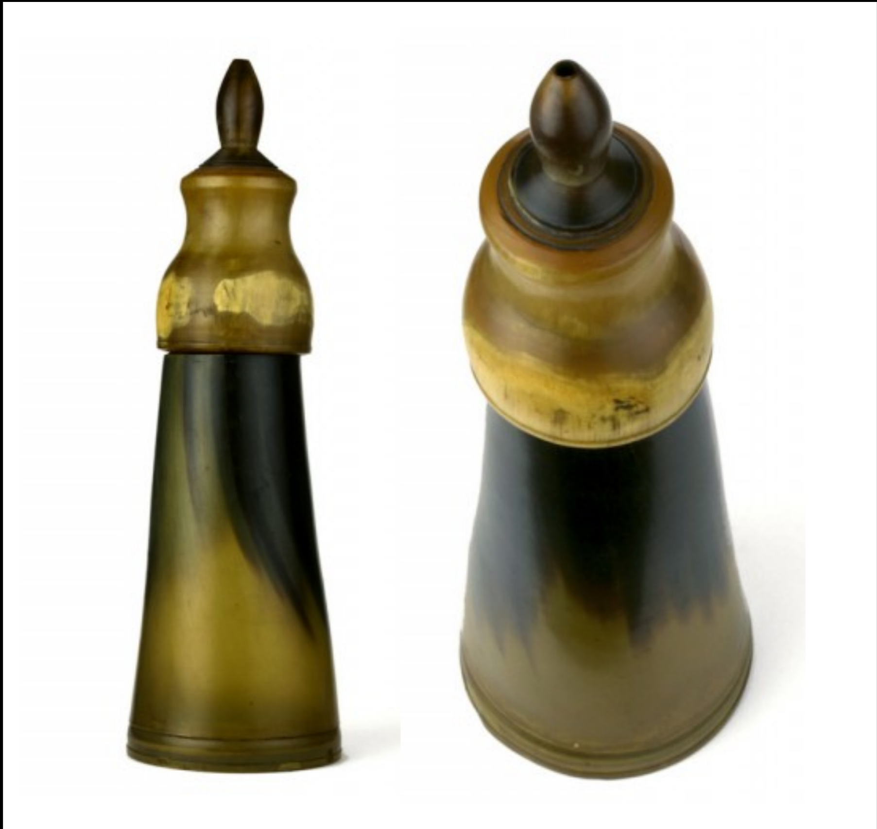
Horn Baby Feeder 18th Century