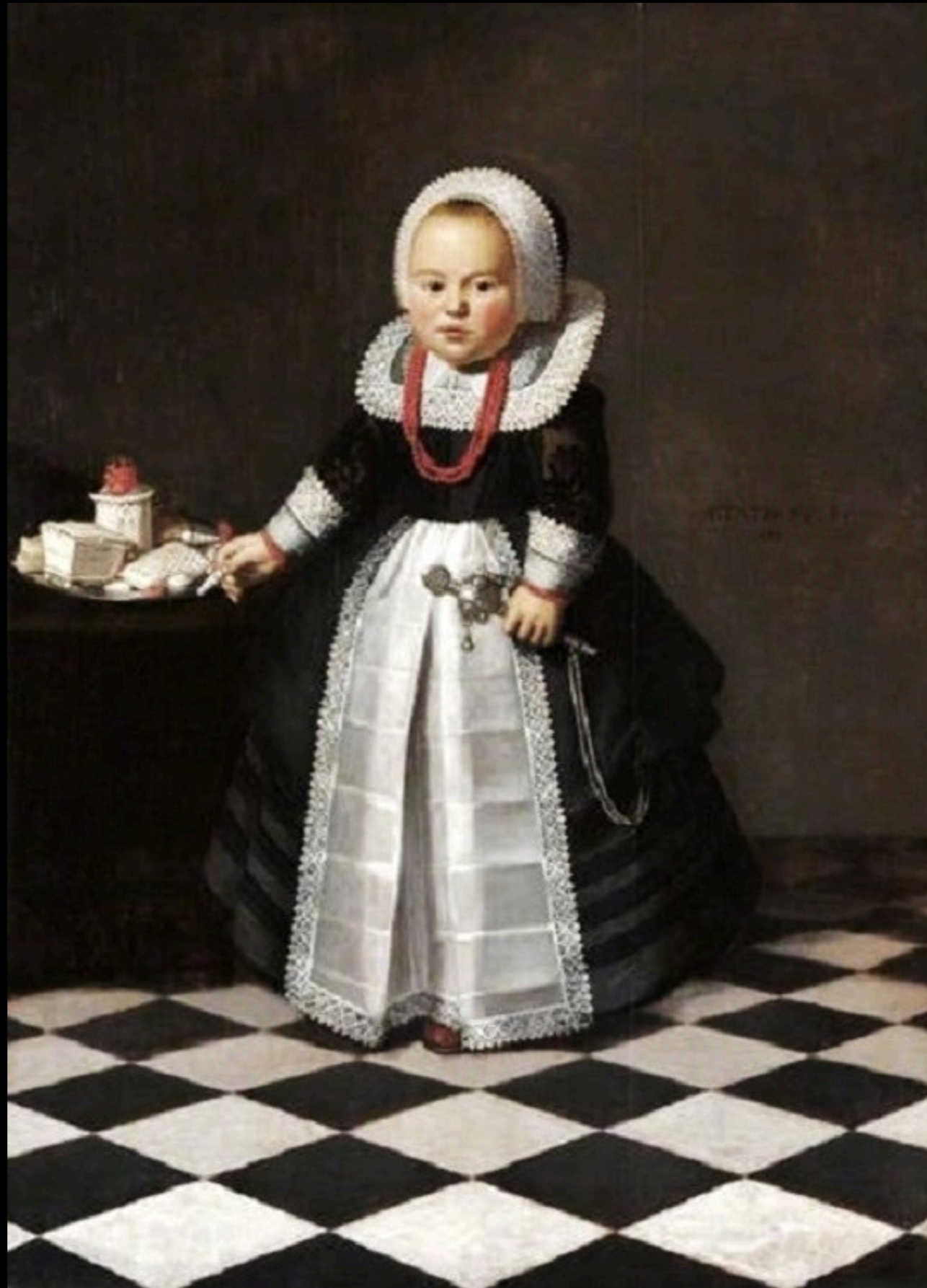
A Young Dutch Girl 1635 (Private Collection)