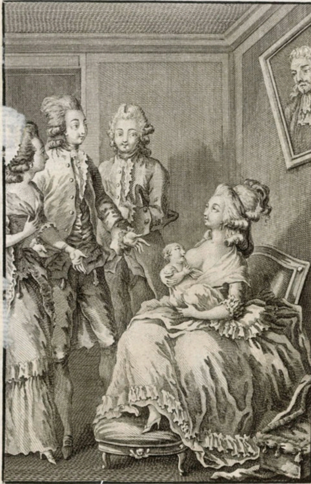
La Centseptieme Nouvelle 18th Century (Private Collection)