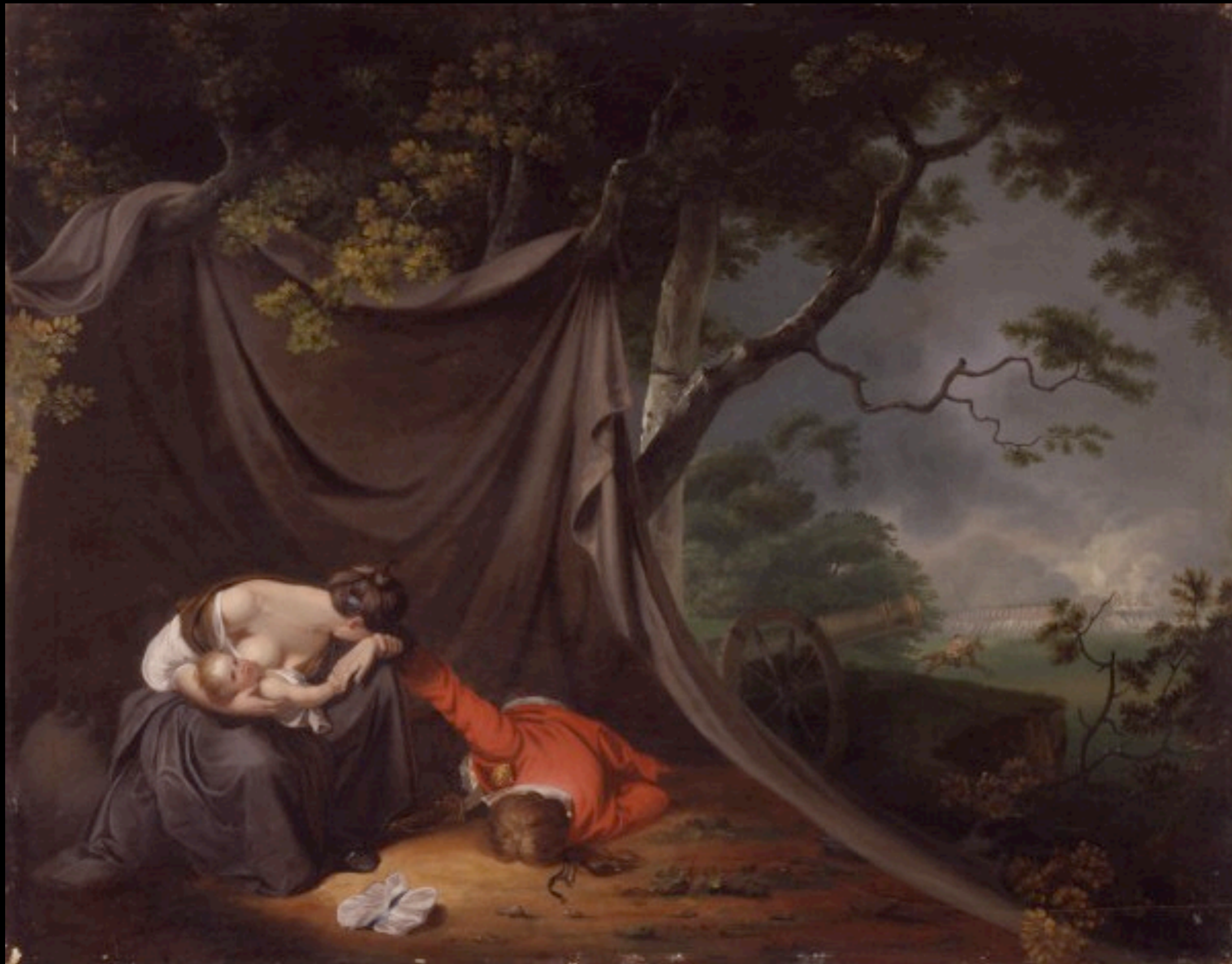
“Dead Soldier” after Joseph Wright of Derby (Huntington Library)