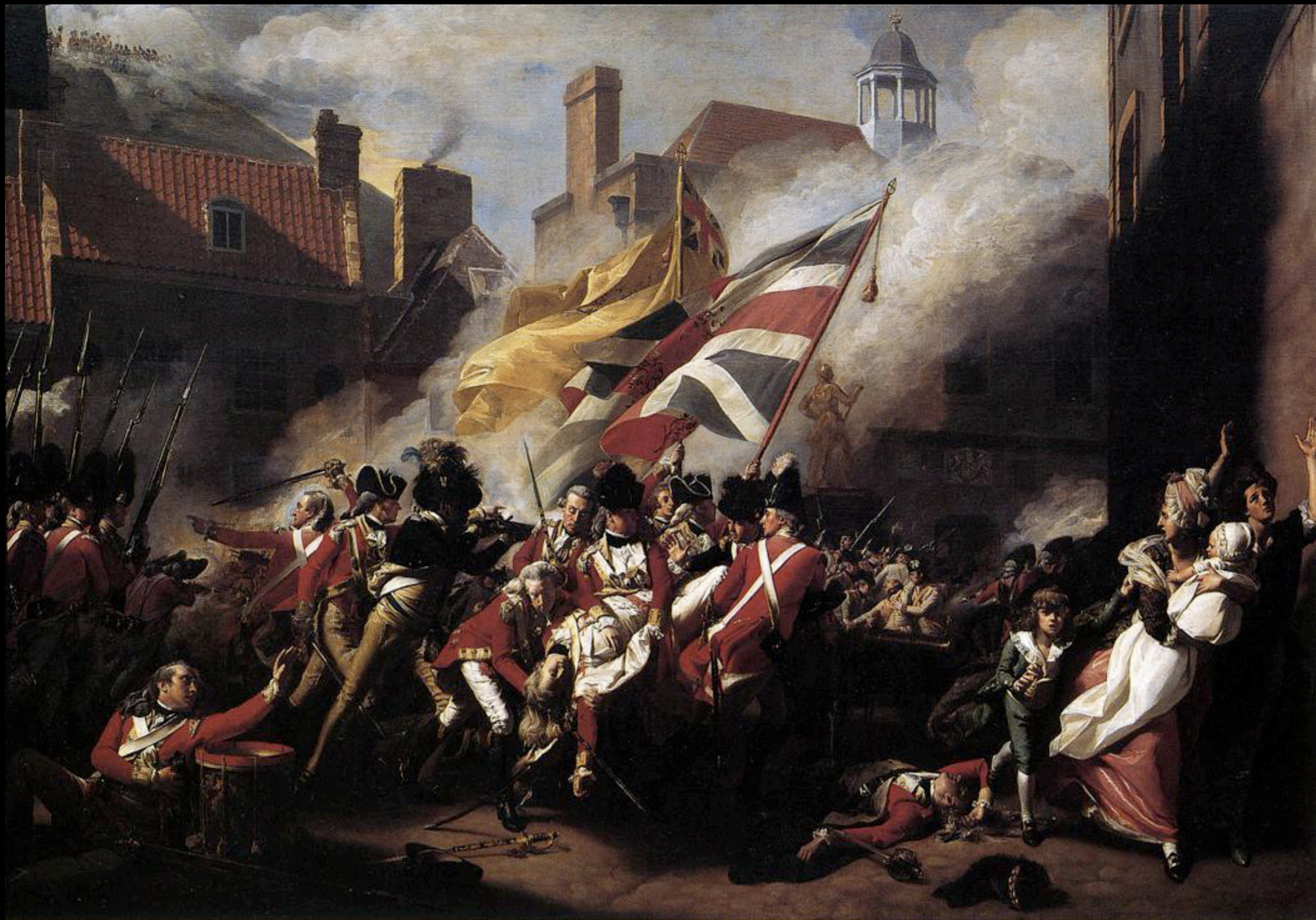
The Death of Major Pierson on the Isle of Jersey off France by John Singleton Copley, January 6, 1781 (Tate)