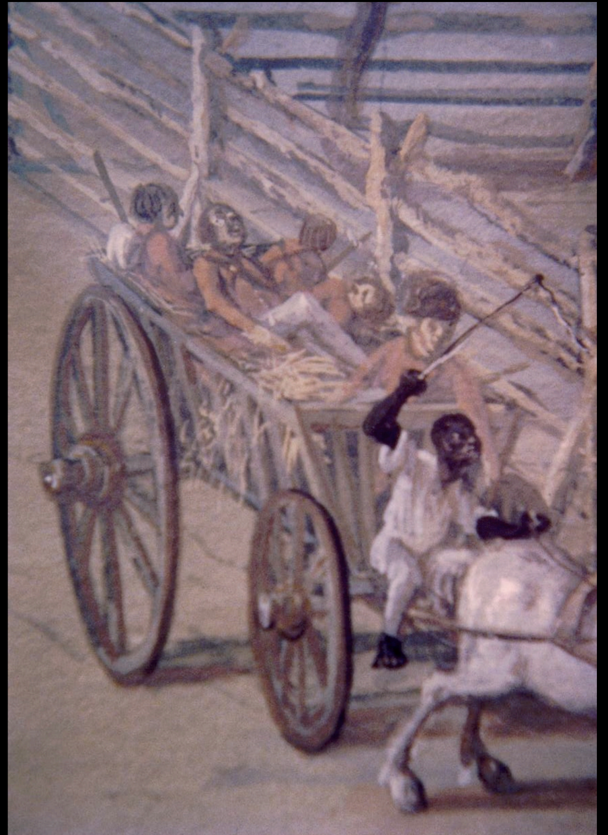
The Battle of Germantown 1777 by Xavier Della Gatta 1782 (Museum of the American Revolution)