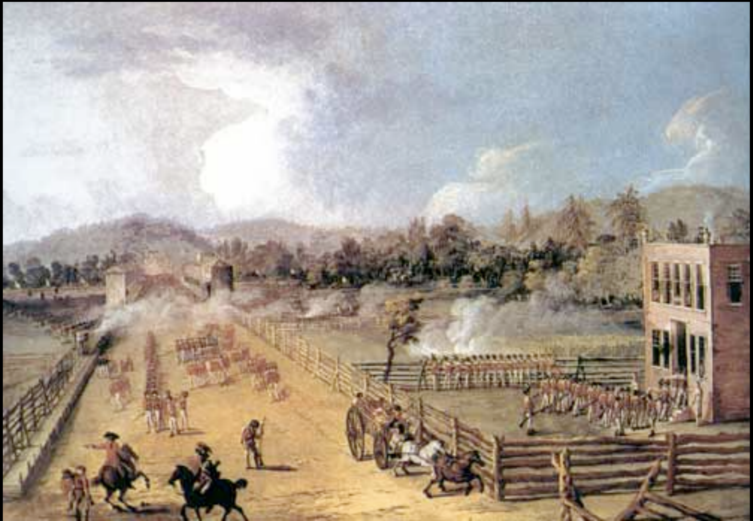
The Battle of Germantown 1777 by Xavier Della Gatta 1782 (Museum of the American Revolution)