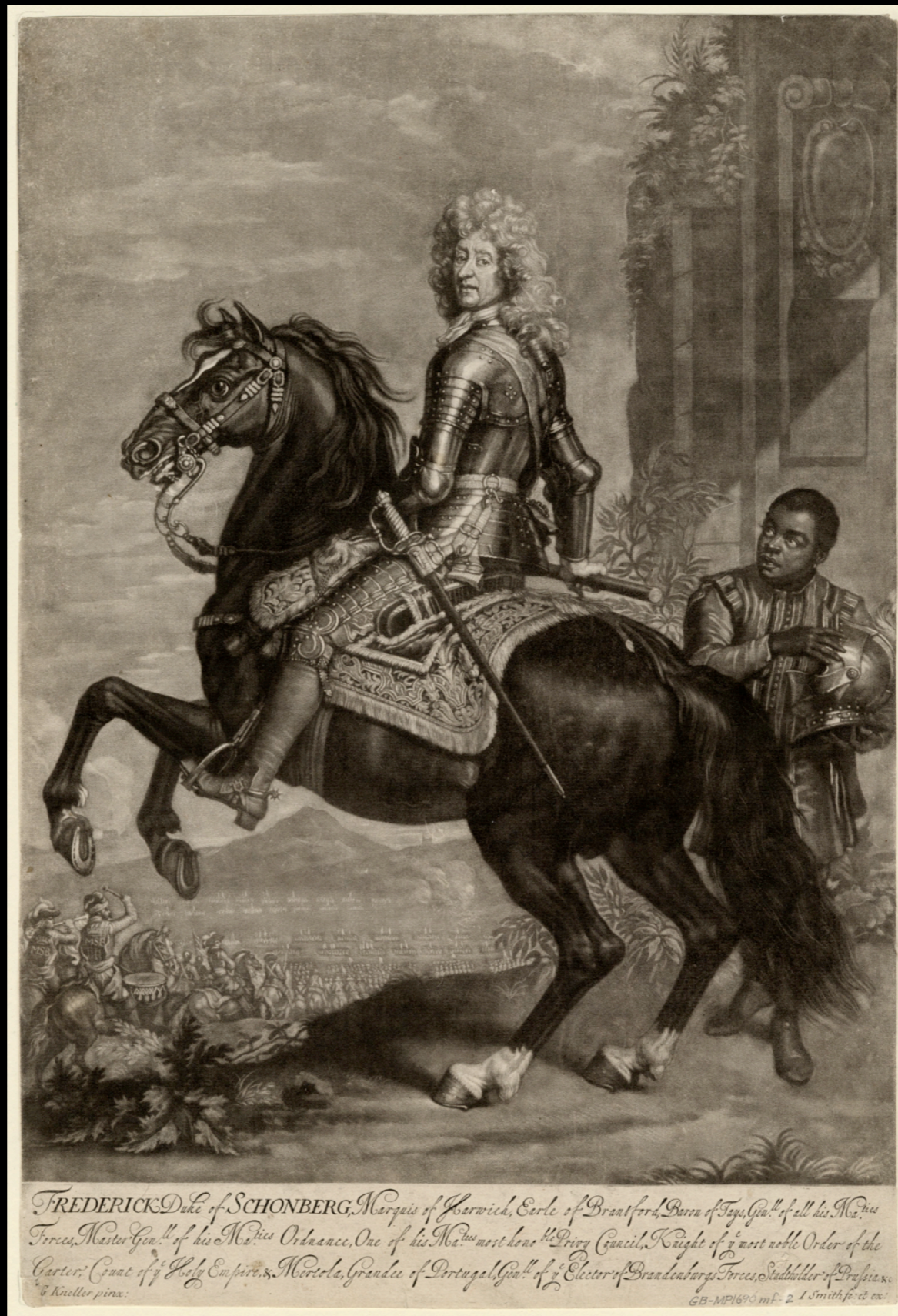
“FREDERICK DUKE OF SCHONBERG, MARQUIS OF HARWICH, EARLE OF BRANSFORD, BARON OF TAYS, GENLL. OF ALL HIS MATIES. FORCES” by Godfrey Kneller, engraved by John Smith c. 1690