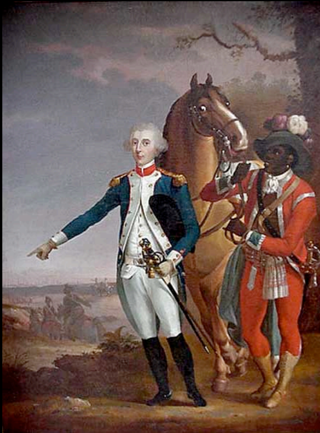
Lafayette and James Amistead at Yorktown by Jean-Baptiste Le Paon c. 1783