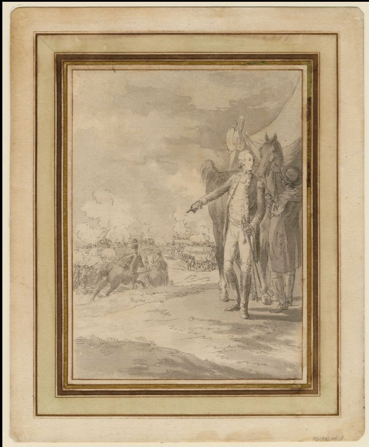
Major General Marquis De Lafayette