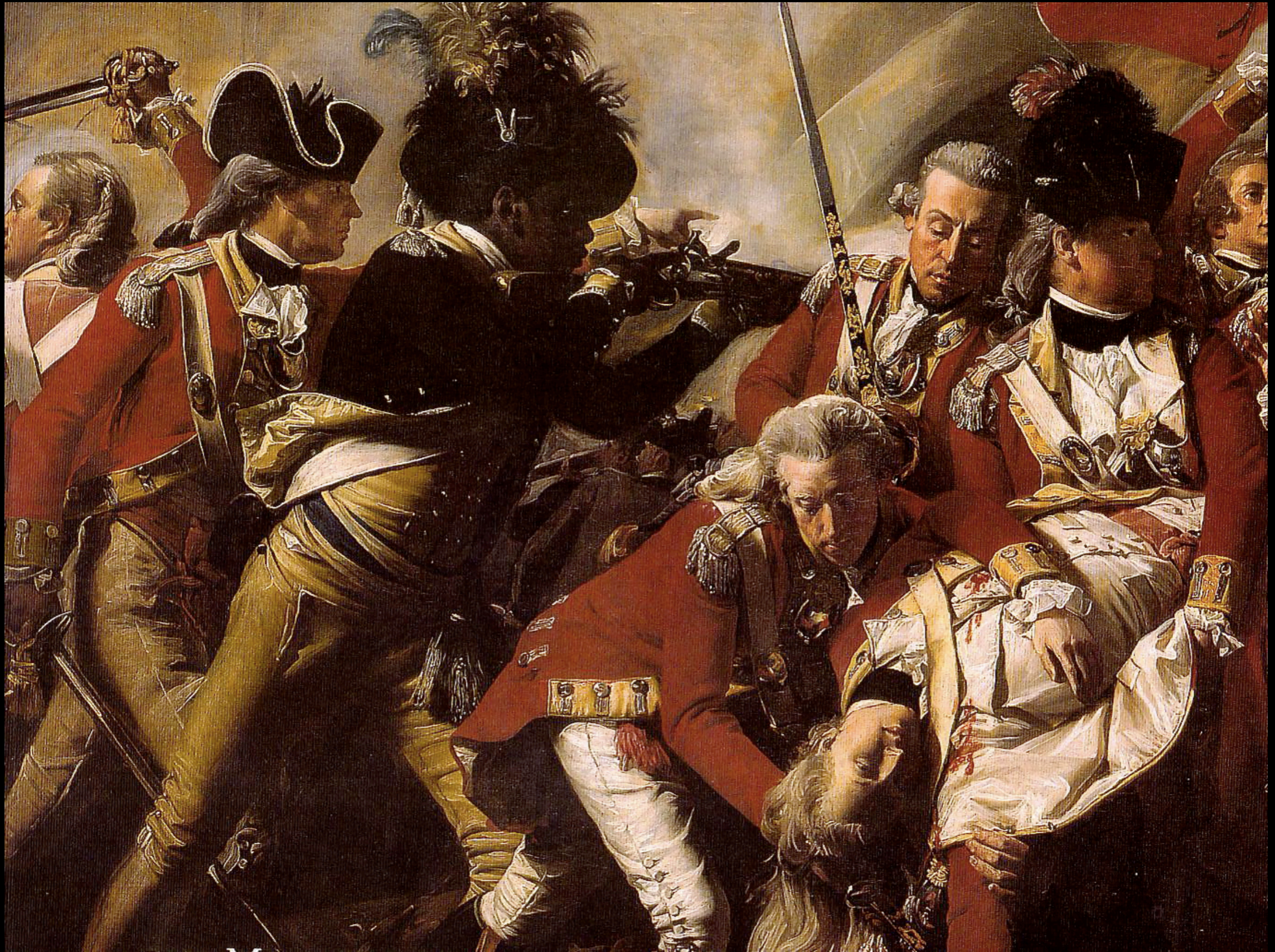
The Death of Major Pierson on the Isle of Jersey off France by John Singleton Copley, January 6, 1781 (Tate)