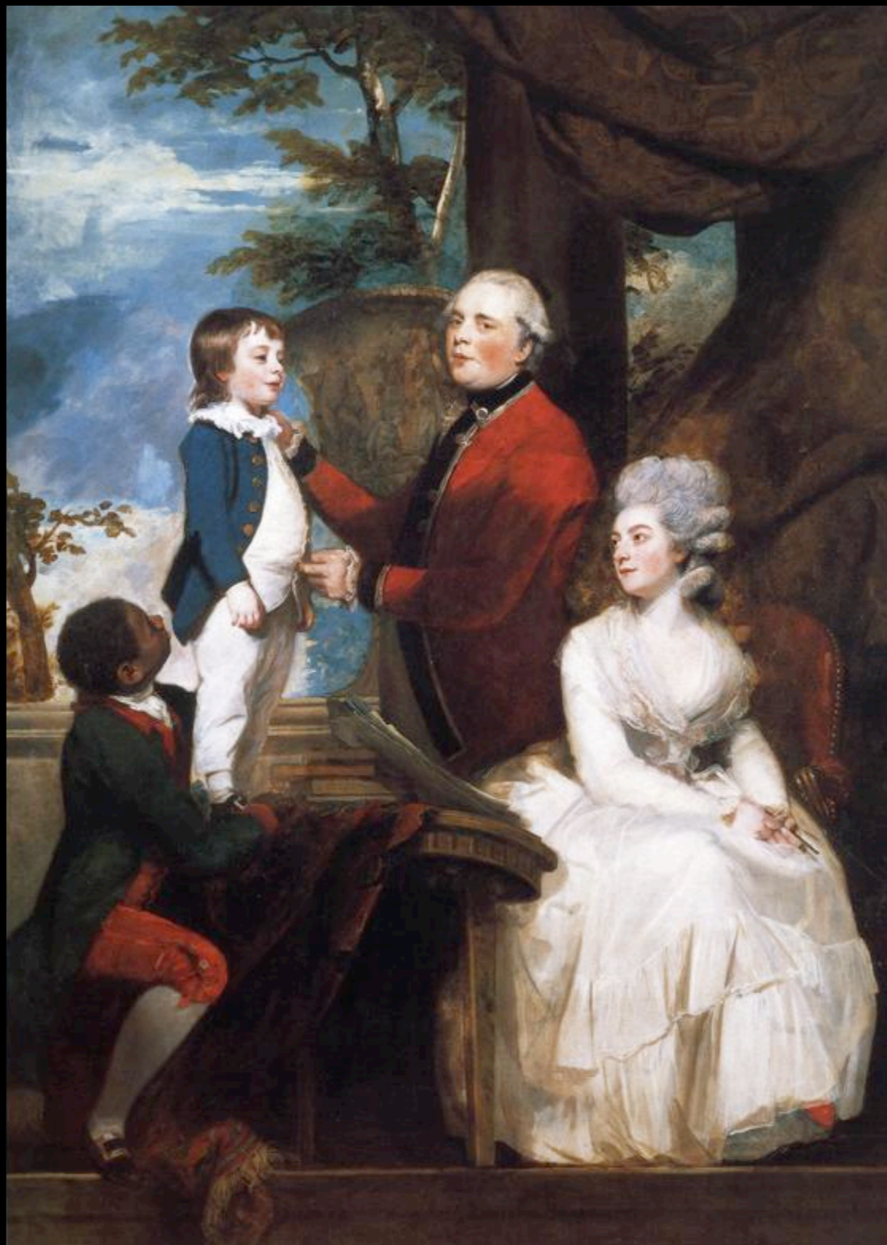
George Grenville, Earl Temple, Mary, Countess Temple, and Their Son Richard by Sir Joshua Reynolds 1780 (National Gallery of Ireland, Dublin)