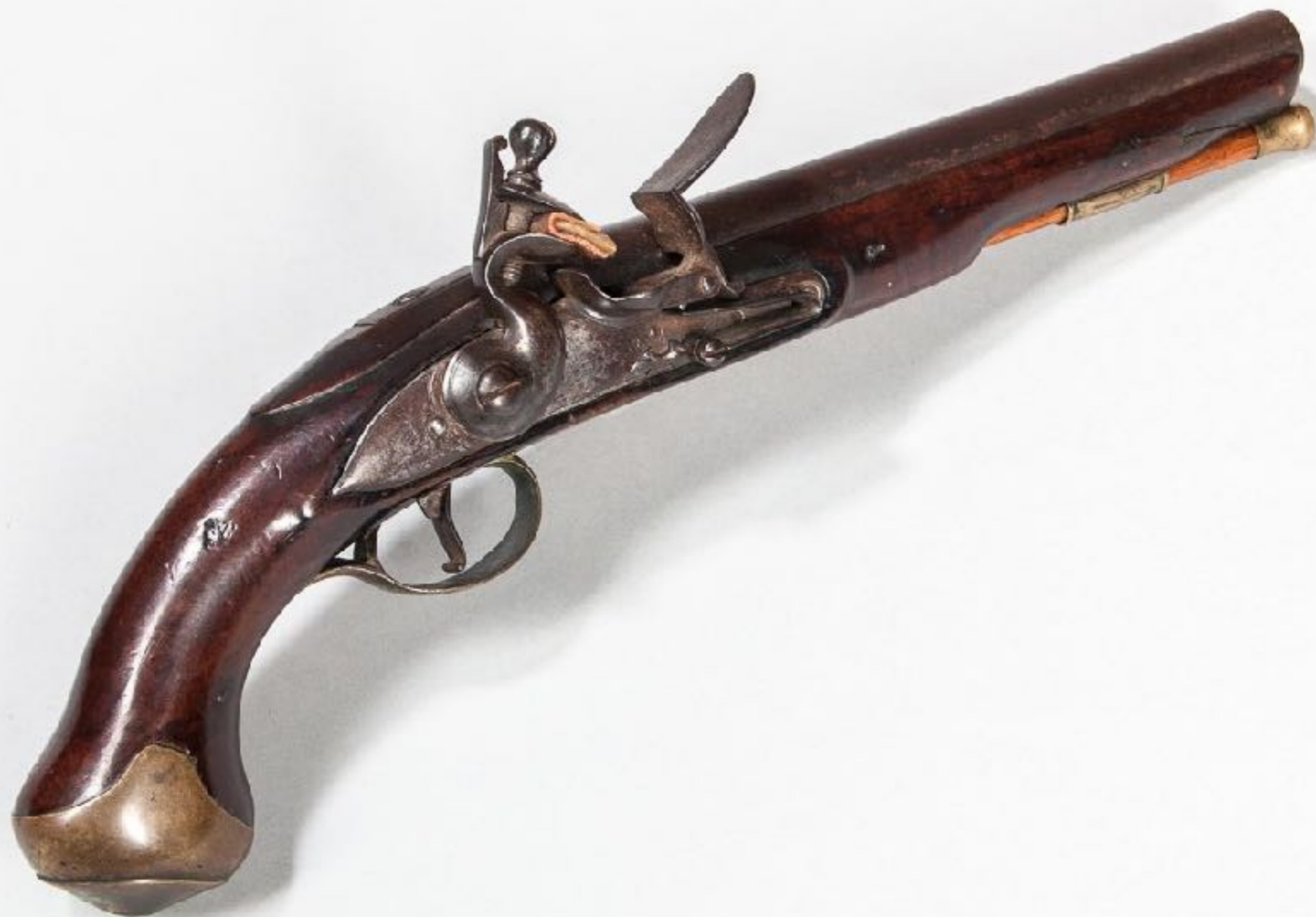
English Pattern 1759 Light Dragoon Pistol Marked "TOWER" (Skinner - Bill Ahearn Collection)