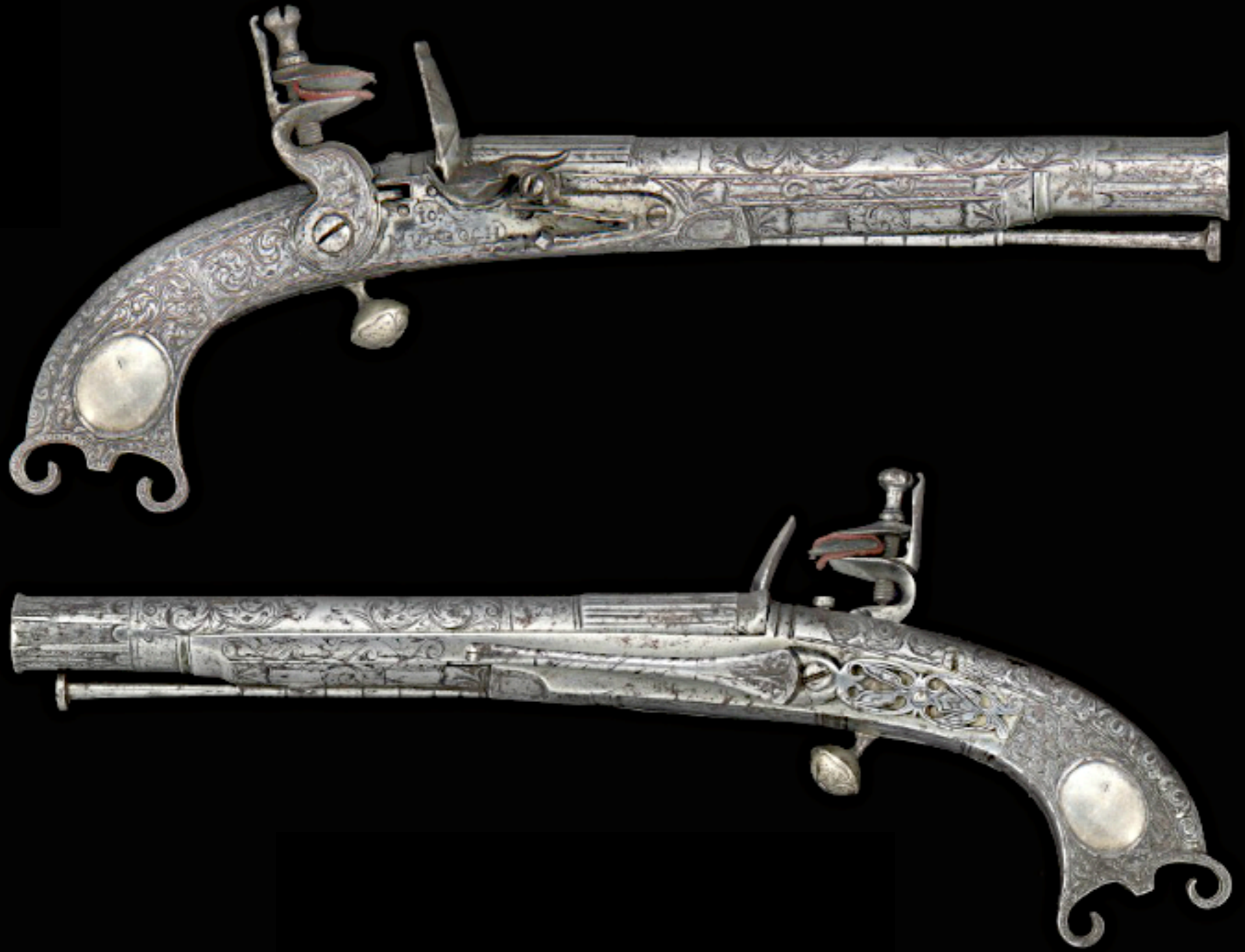
Pair of Scottish Pistols Marked "MURDOCH" c. 1750 - 1760