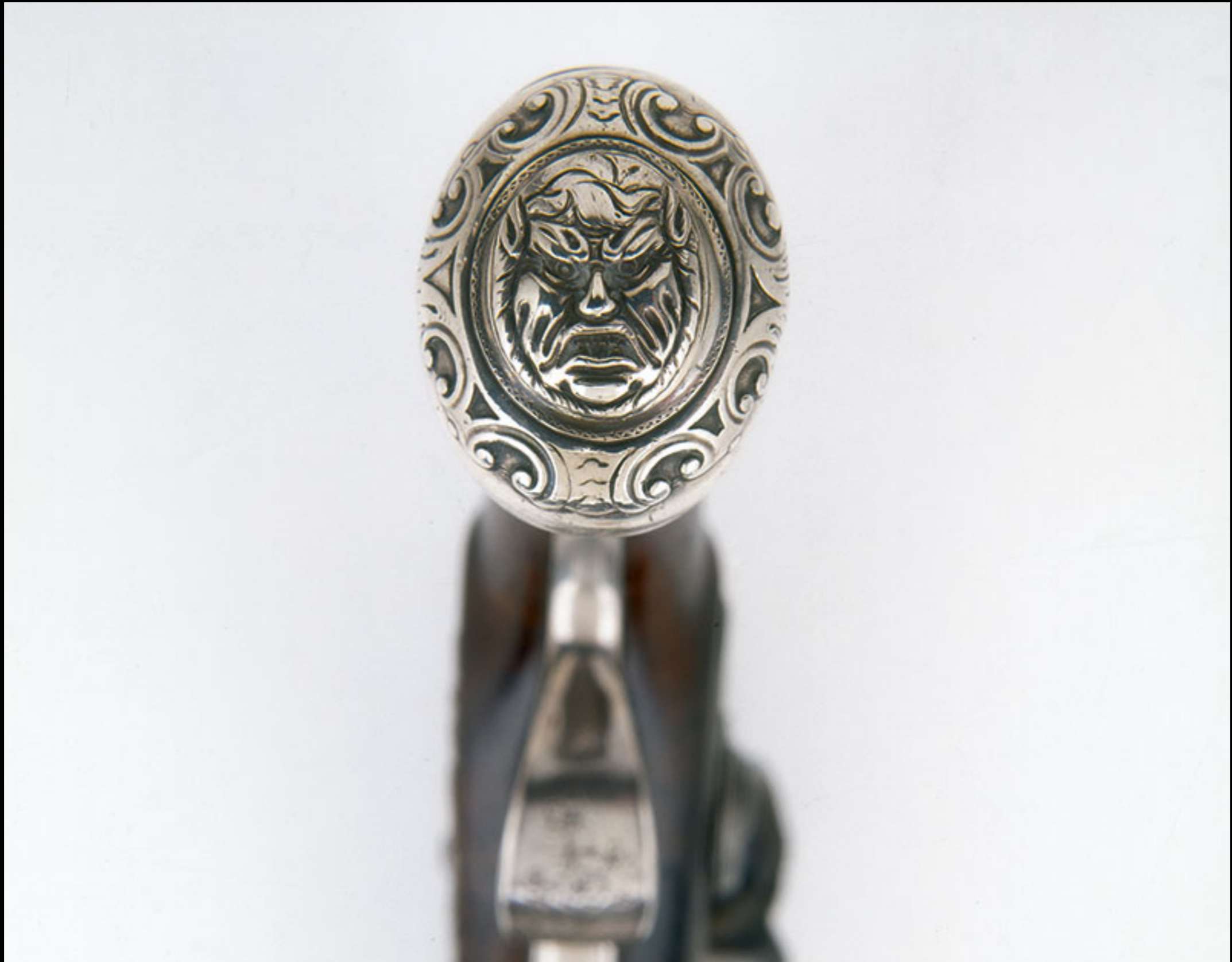
English Holster Pistols Owned by Brigadier General John Peter Muhlenberg of Pennsylvania Mid 18th Century