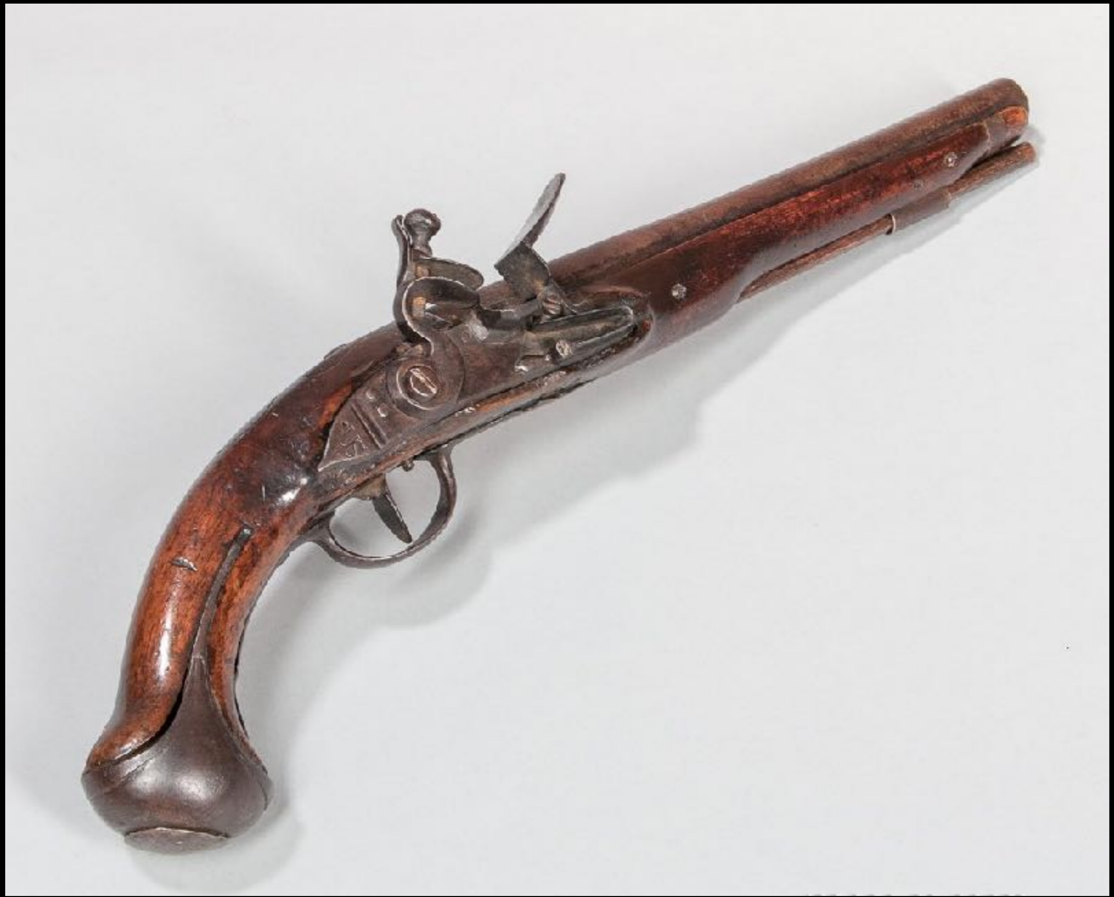
Continental Holster Pistol with U.S. Surcharges Marked "US" Mid 18th Century