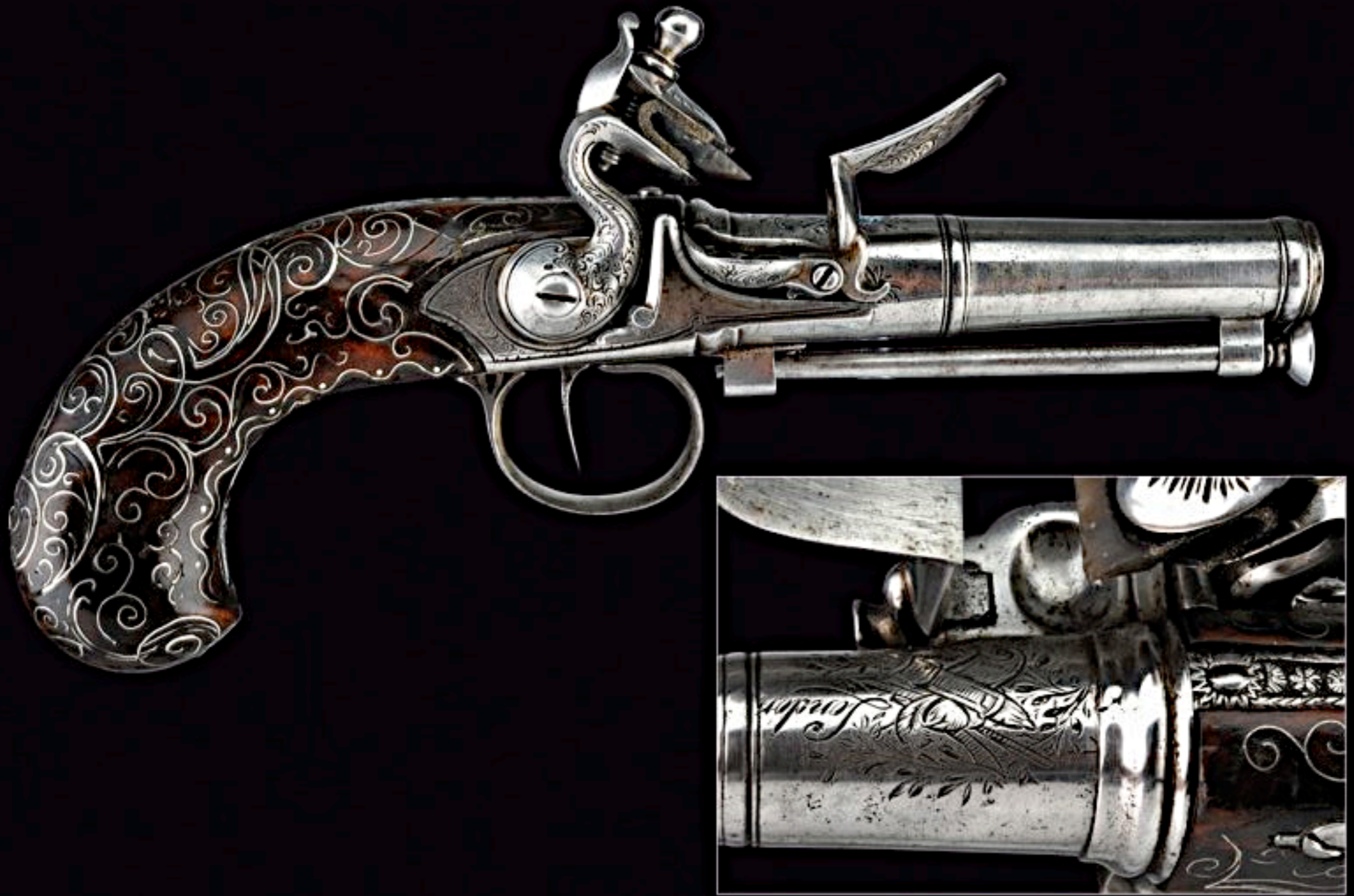
English Silver Inlay Pistol Marked "LONDON" Late 18th Century (Private Collection)