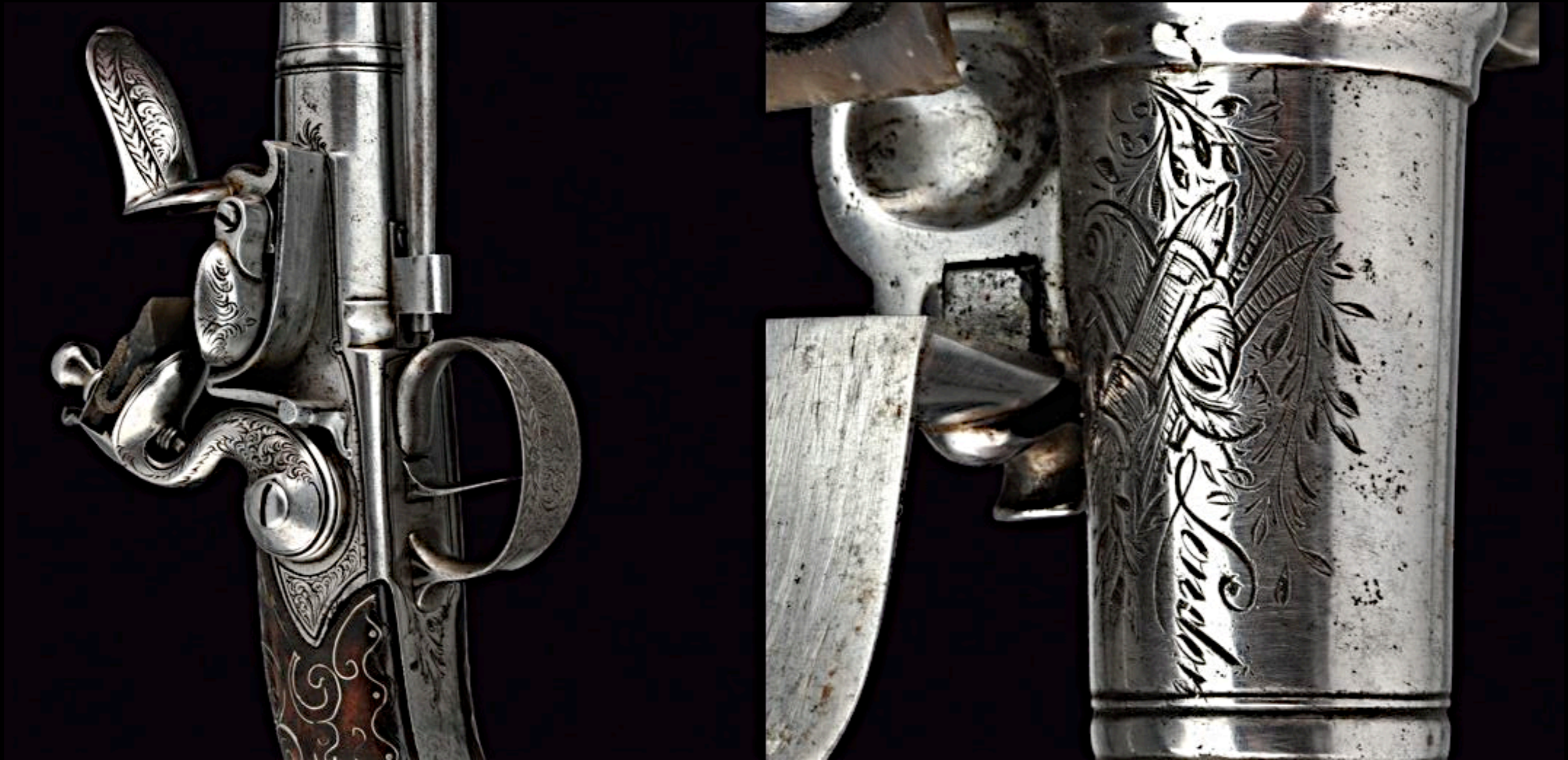
English Silver Inlay Pistol Marked "LONDON" Late 18th Century (Private Collection)