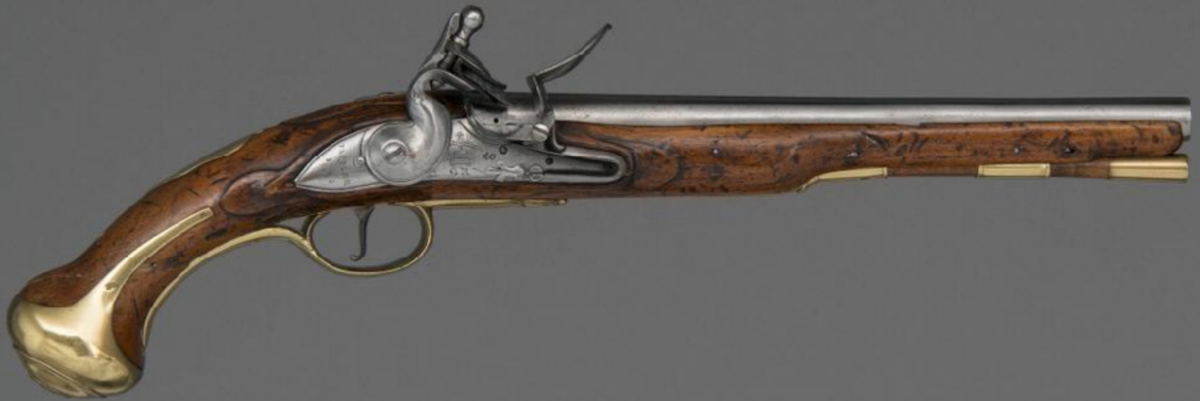
English Pattern 1738 Land Service Pistol c. 1745 - 1750 (Colonial Williamsburg Foundation)