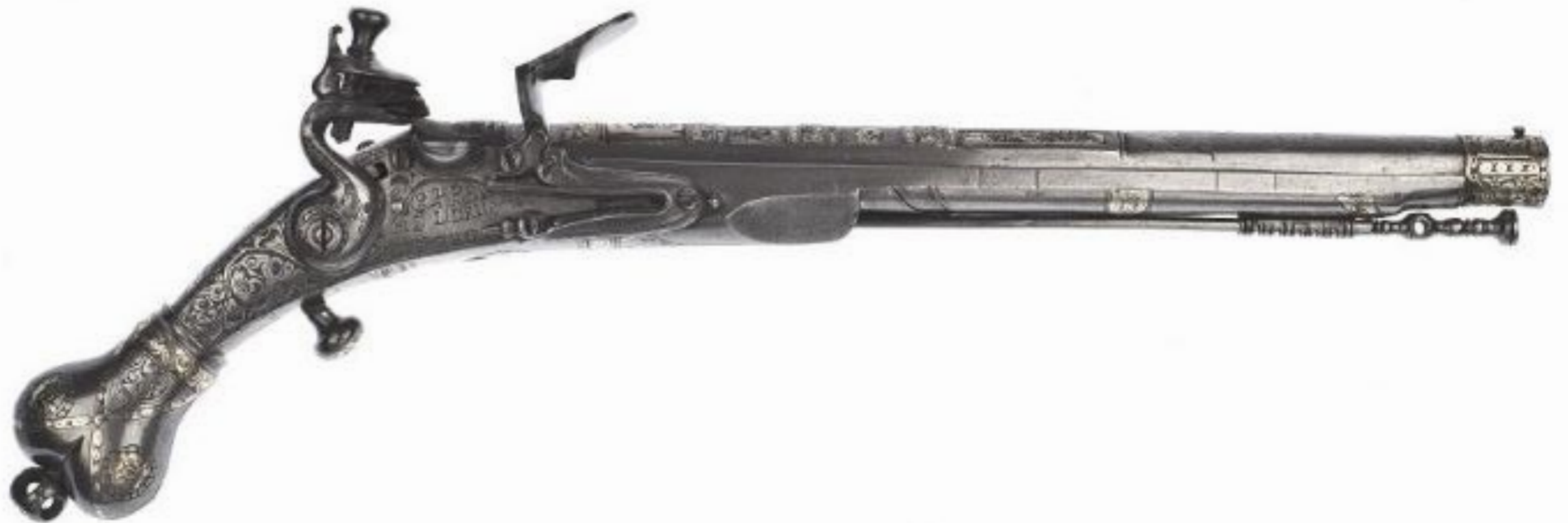
Scottish Belt Pistol Marked "OLD MELDRUM - R - ALEX SHIRES" c. 1700 (Private Collection)