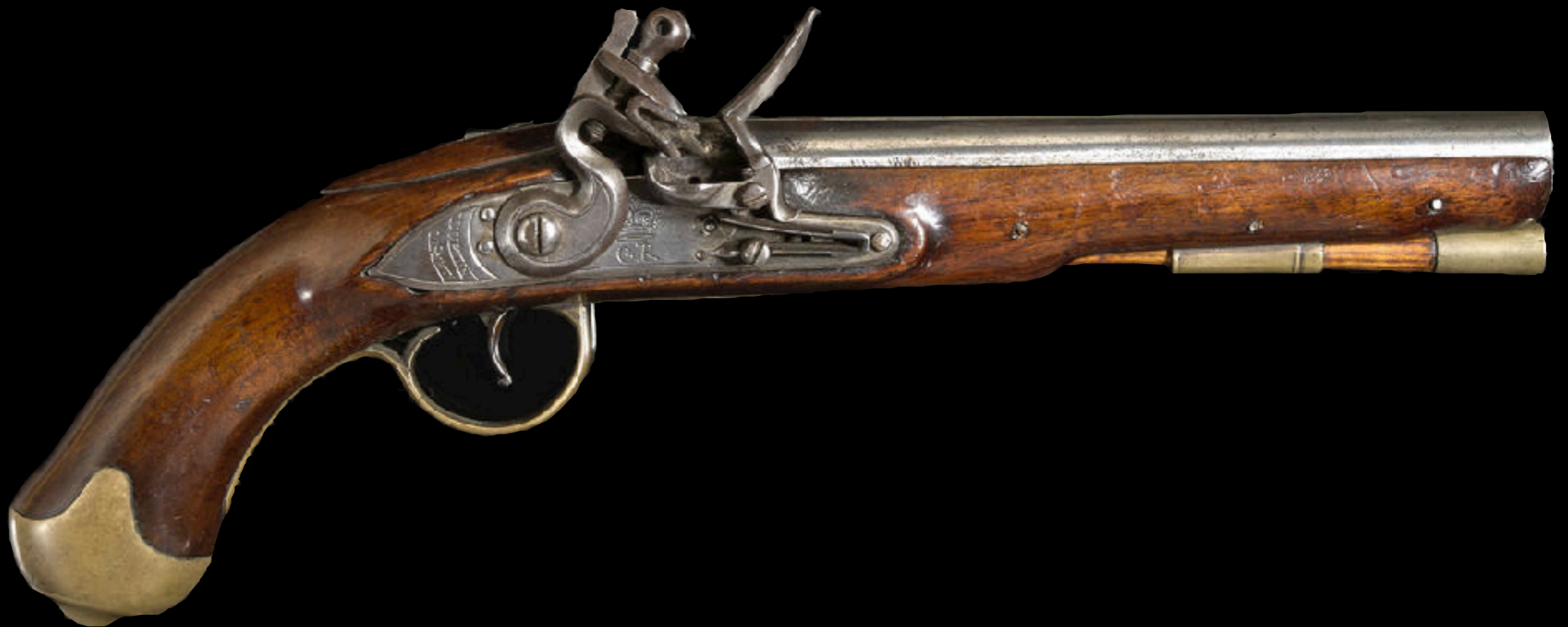
English Light Dragoon Pistol Marked "DUBLIN CASTLE"/"GR" Cypher c. 1777+