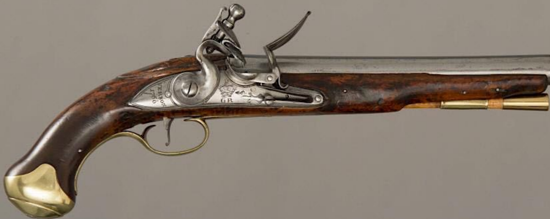
English Pattern 1738 Elliot Light Dragoon Pistol Marked "VERNON/1760" 1760