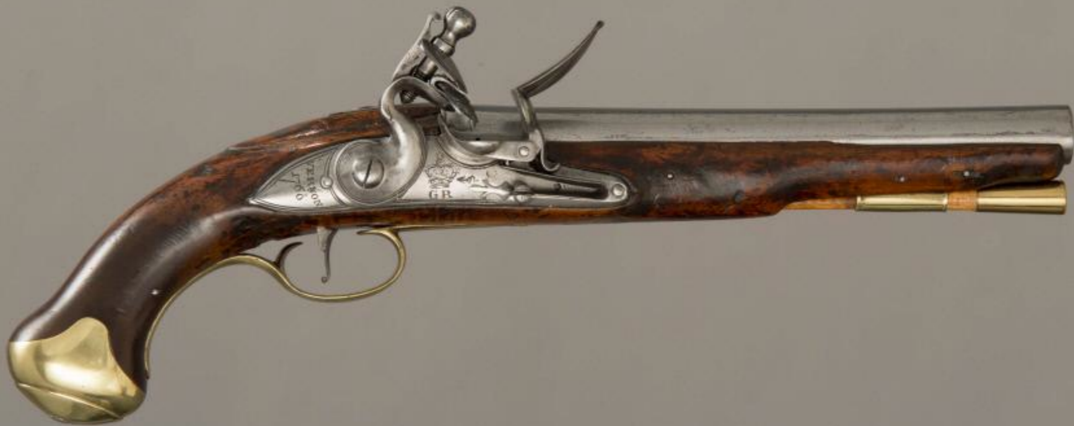
English Board of Ordnance Elliot Light Dragoon Pistol c. 1760 - 1764 (Colonial Williamsburg Foundation)