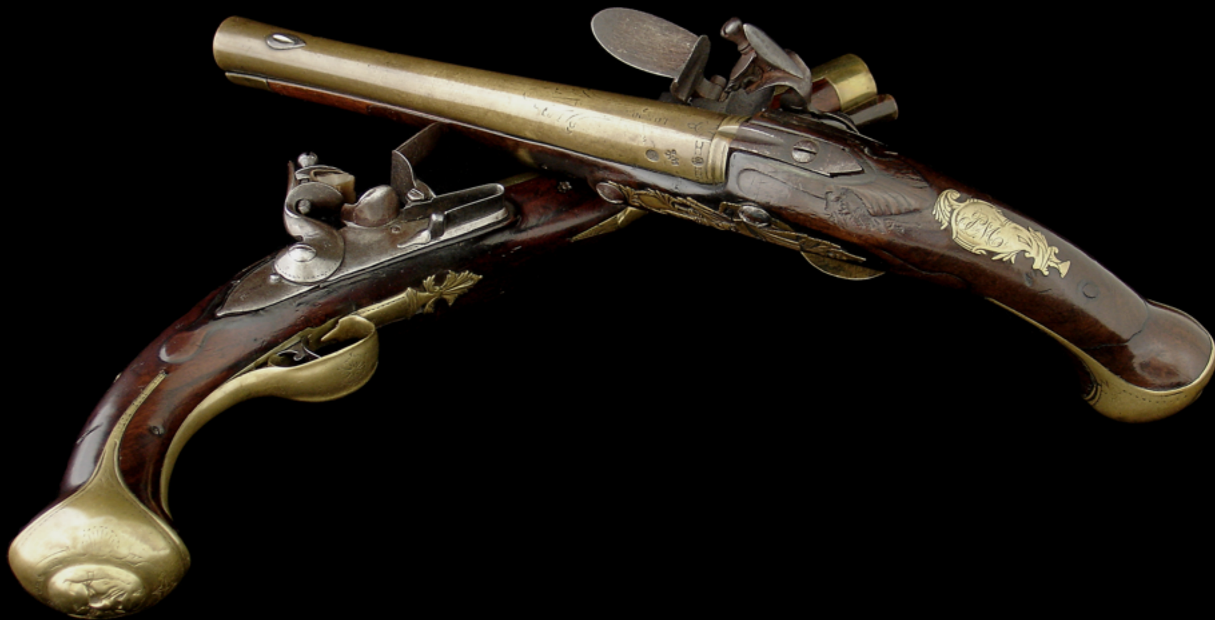
English Holster Pistols Owned by Brigadier General John Peter Muhlenberg of Pennsylvania Mid 18th Century