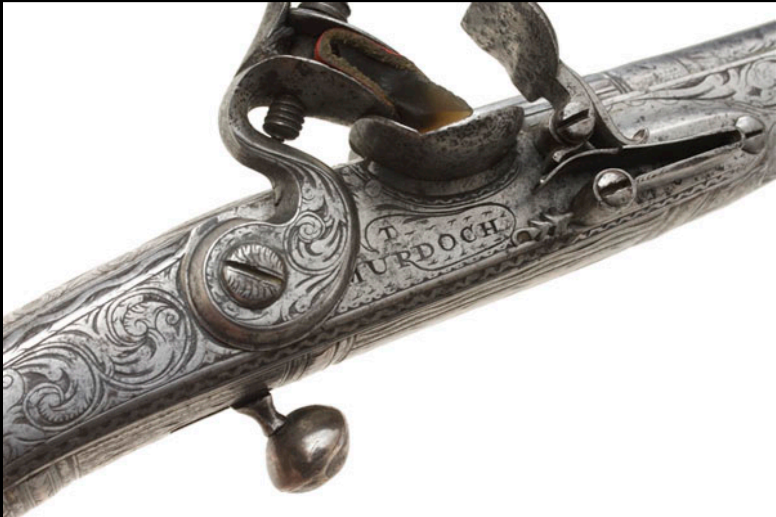
Pair of Scottish Pistols Marked "MURDOCH" c. 1750 - 1760