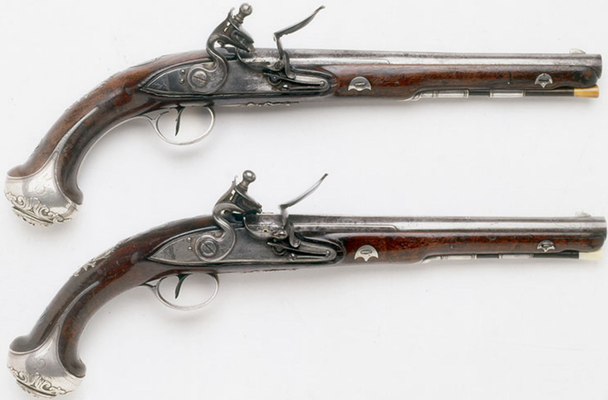
English Holster Pistols Owned by Brigadier General John Peter Muhlenberg of Pennsylvania Mid 18th Century