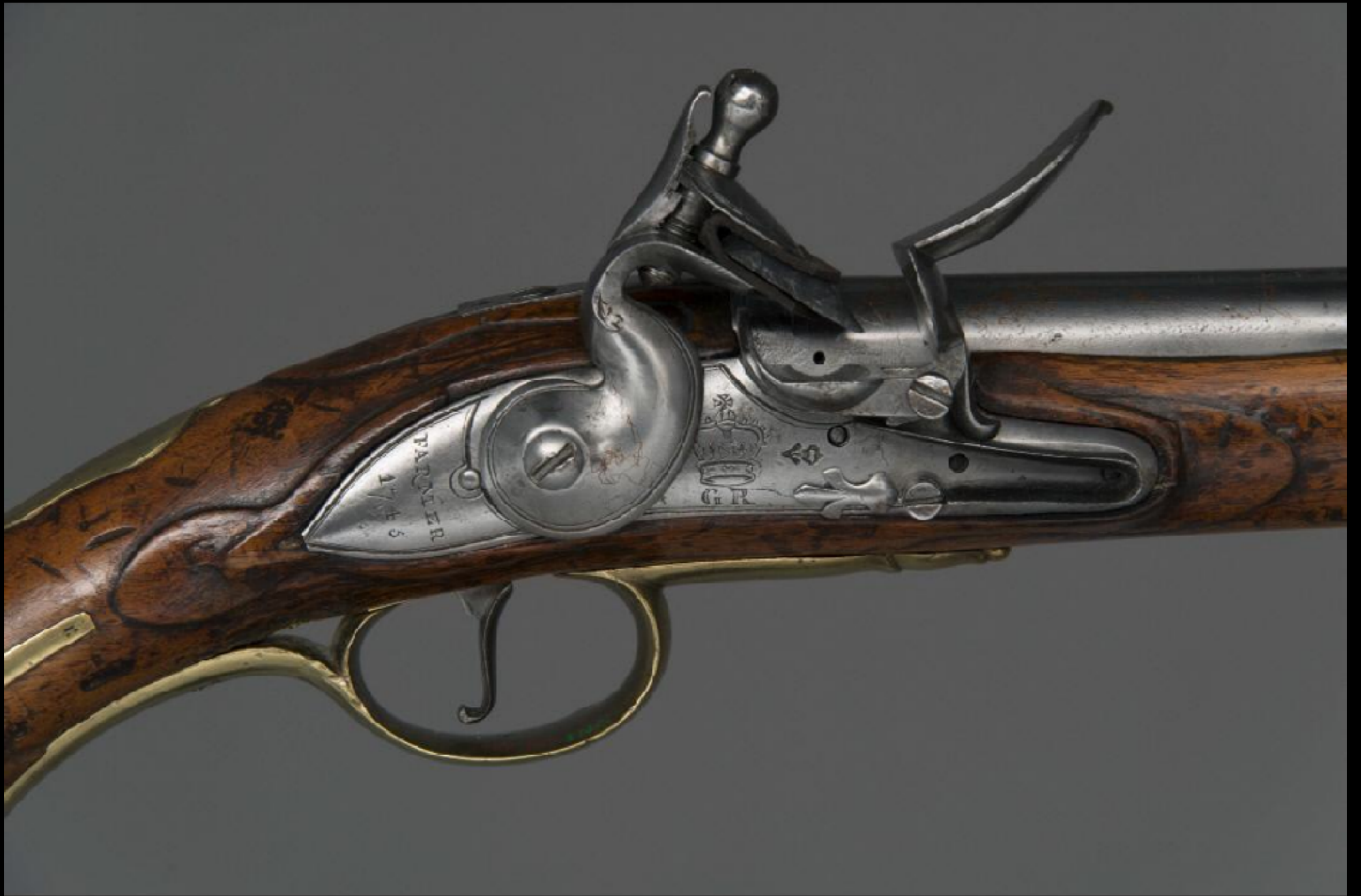
English Pattern 1738 Land Service Pistol c. 1745 - 1750