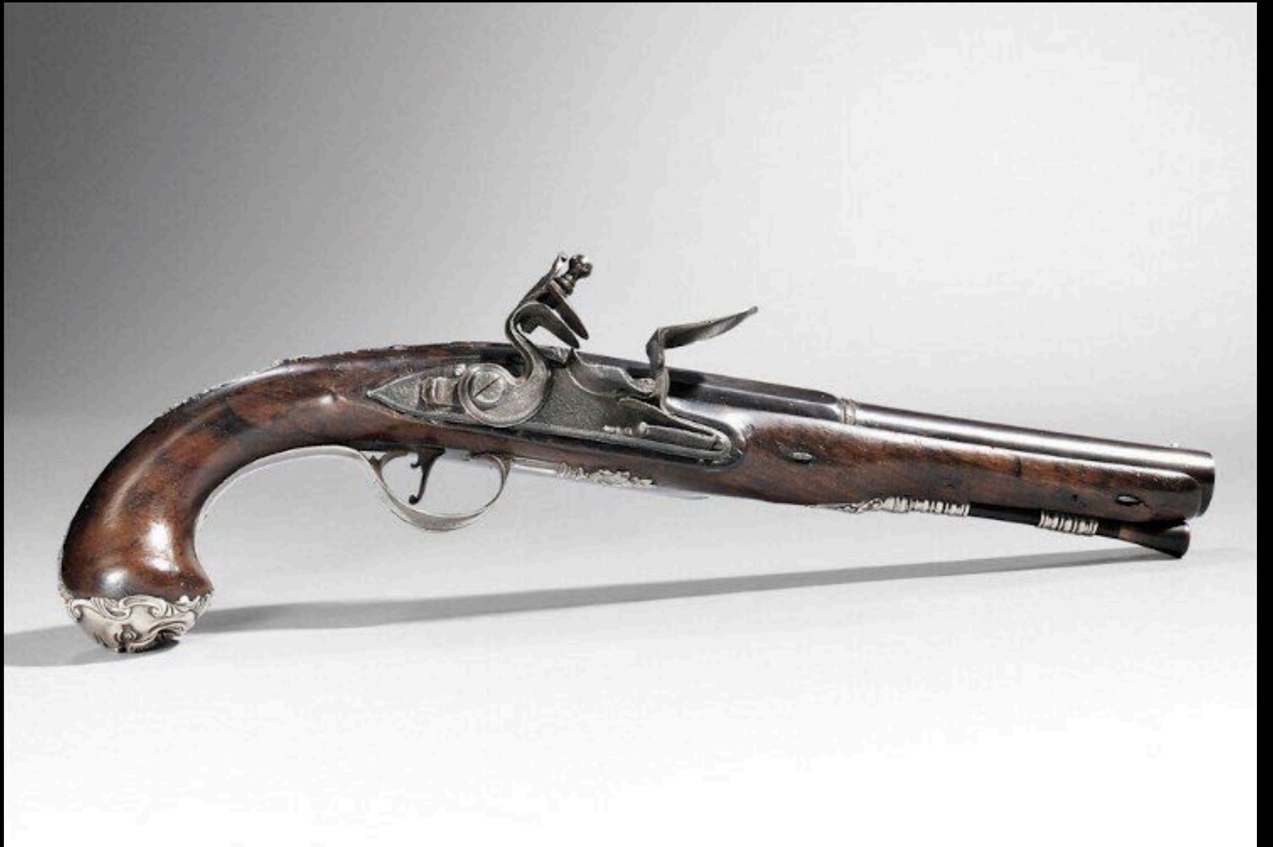
English Silver Mounted Pistol Marked "CLARK" c. 1771