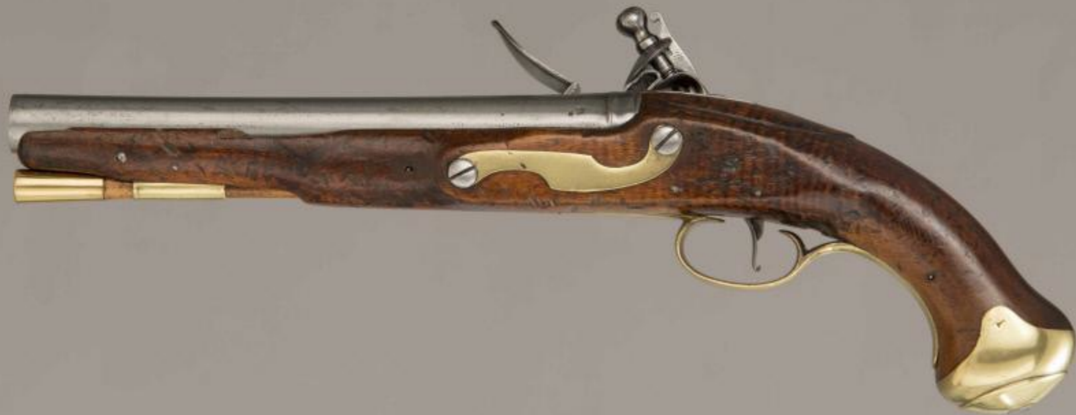
English Board of Ordnance Elliot Light Dragoon Pistol c. 1760 - 1764