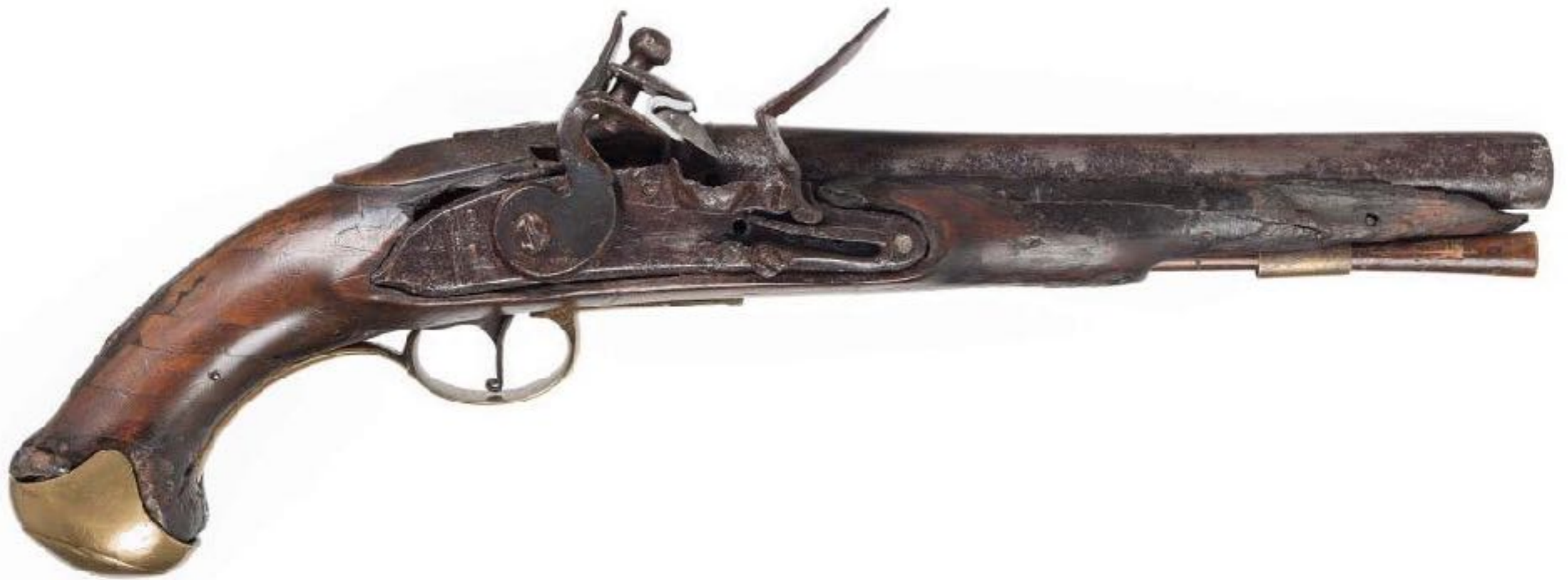
American Pistol Based on the British Pattern 1759 "Elliot" Light Dragoon Pistol Rappanhannock Forge of Falmouth, Virginia c. 1776 - 1781