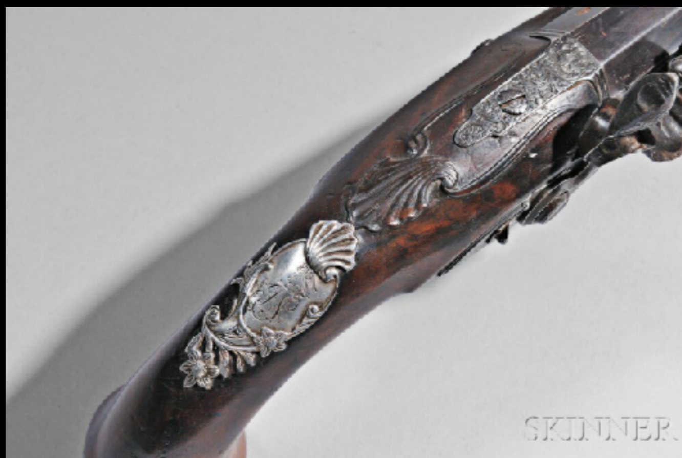
English Silver Mounted Pistol Marked "CLARK" c. 1771