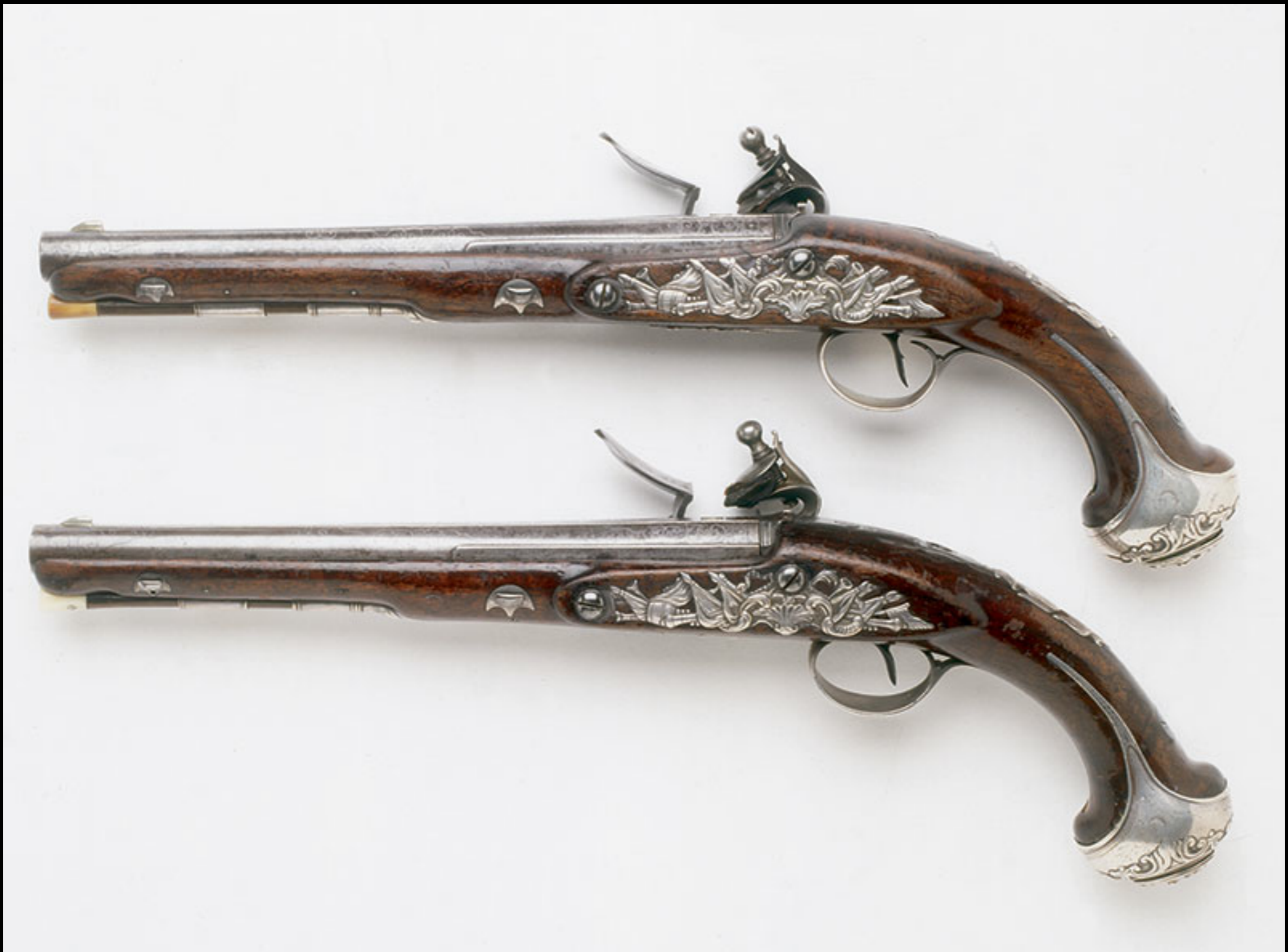
English Holster Pistols Owned by Brigadier General John Peter Muhlenberg of Pennsylvania Mid 18th Century