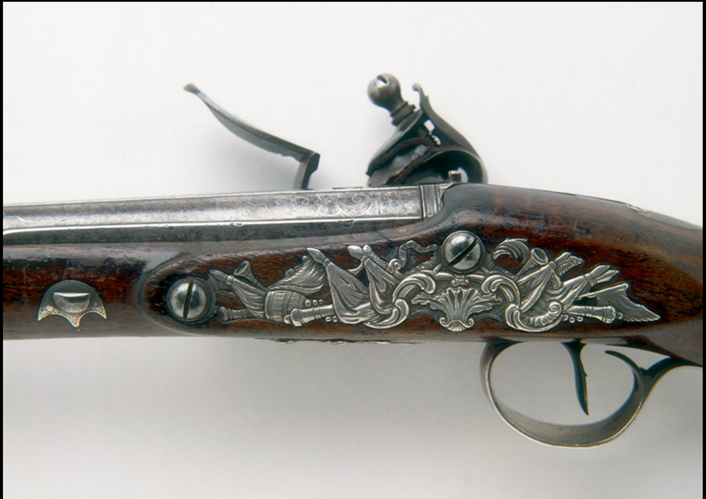
English Holster Pistols Owned by Brigadier General John Peter Muhlenberg of Pennsylvania Mid 18th Century