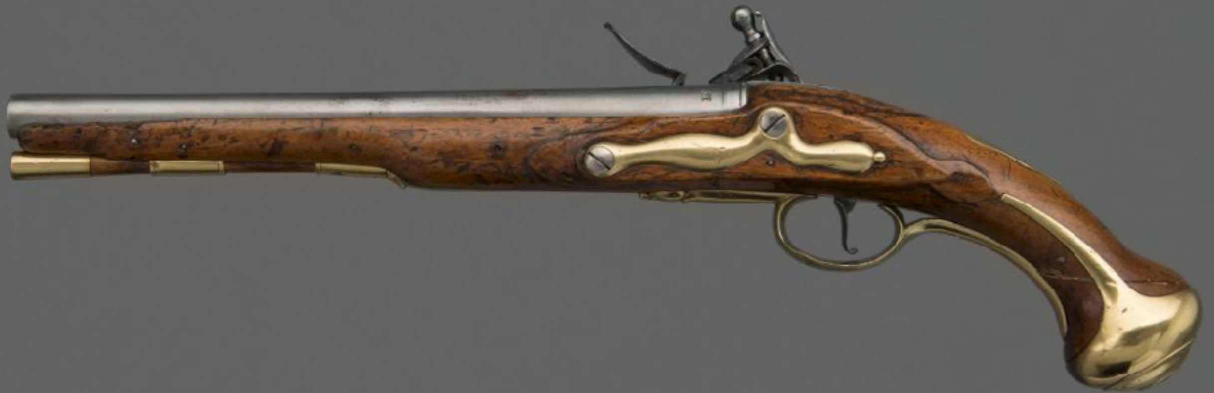
English Pattern 1738 Land Service Pistol c. 1745 - 1750