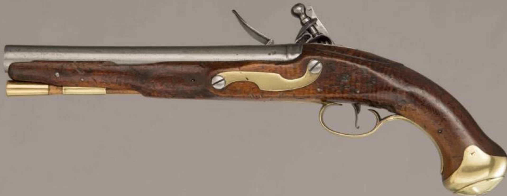
English Pattern 1738 Elliot Light Dragoon Pistol Marked "VERNON/1760" 1760