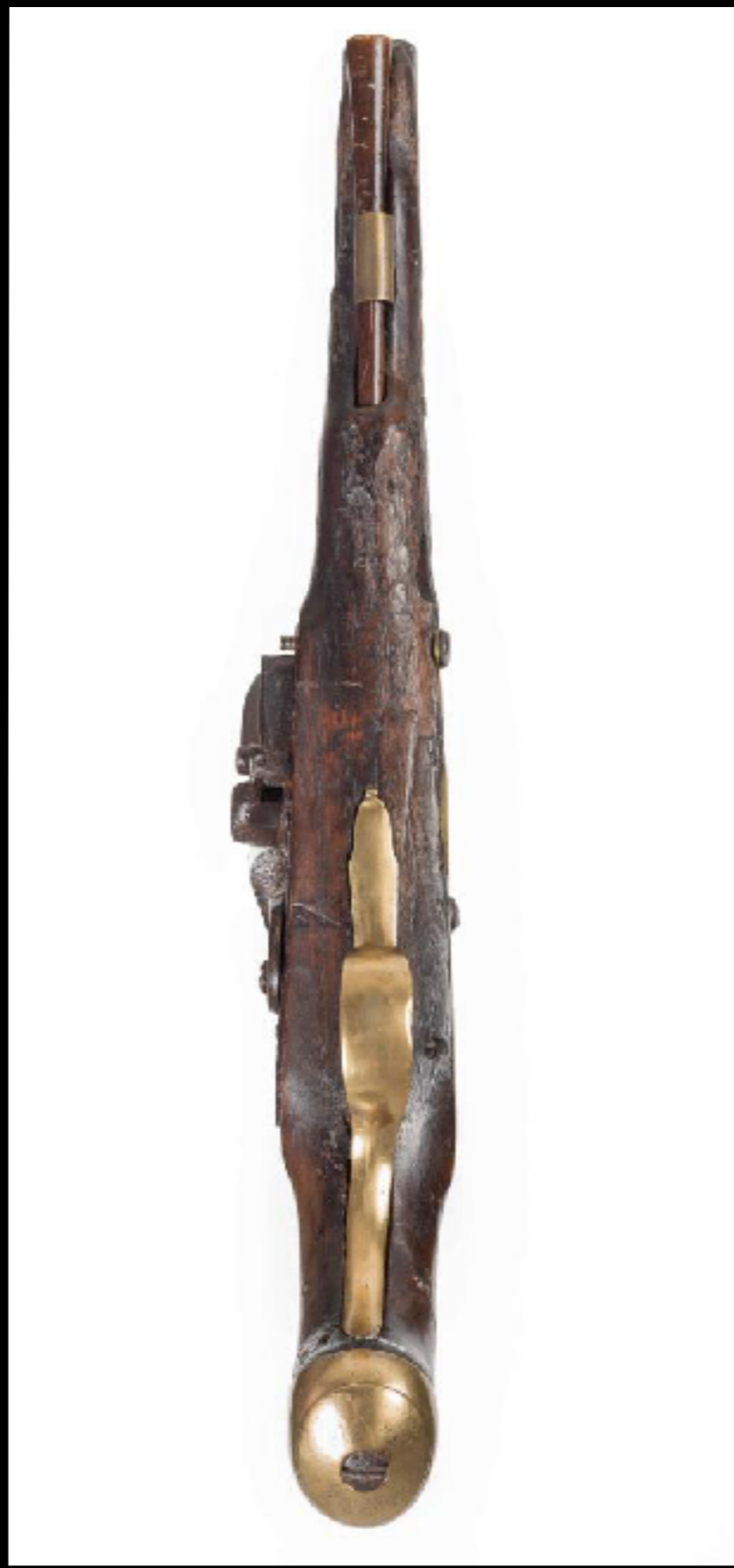
American Pistol Based on the British Pattern 1759 "Elliot" Light Dragoon Pistol Rappanhannock Forge of Falmouth, Virginia c. 1776 - 1781