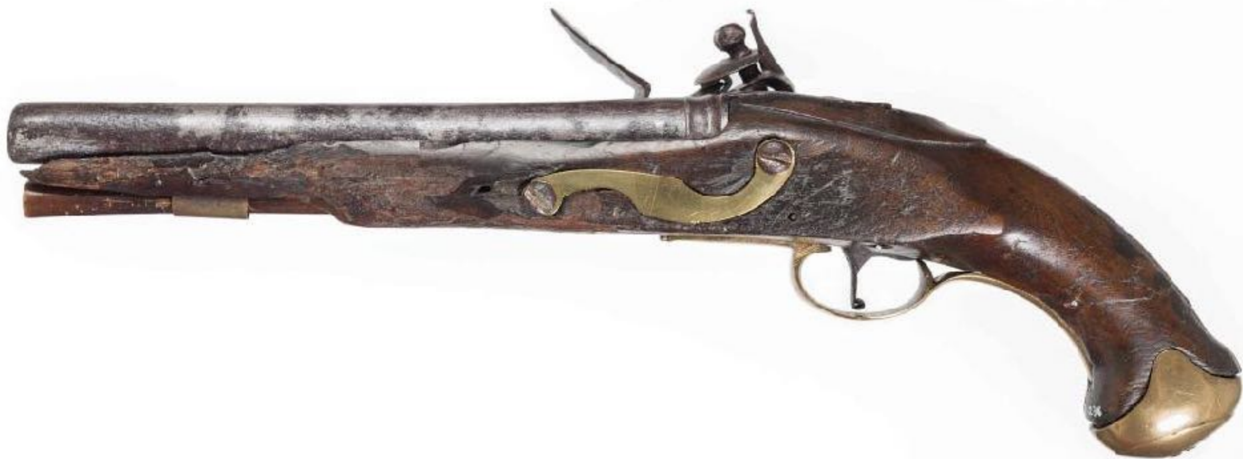
American Pistol Based on the British Pattern 1759 "Elliot" Light Dragoon Pistol Rappanhannock Forge of Falmouth, Virginia c. 1776 - 1781