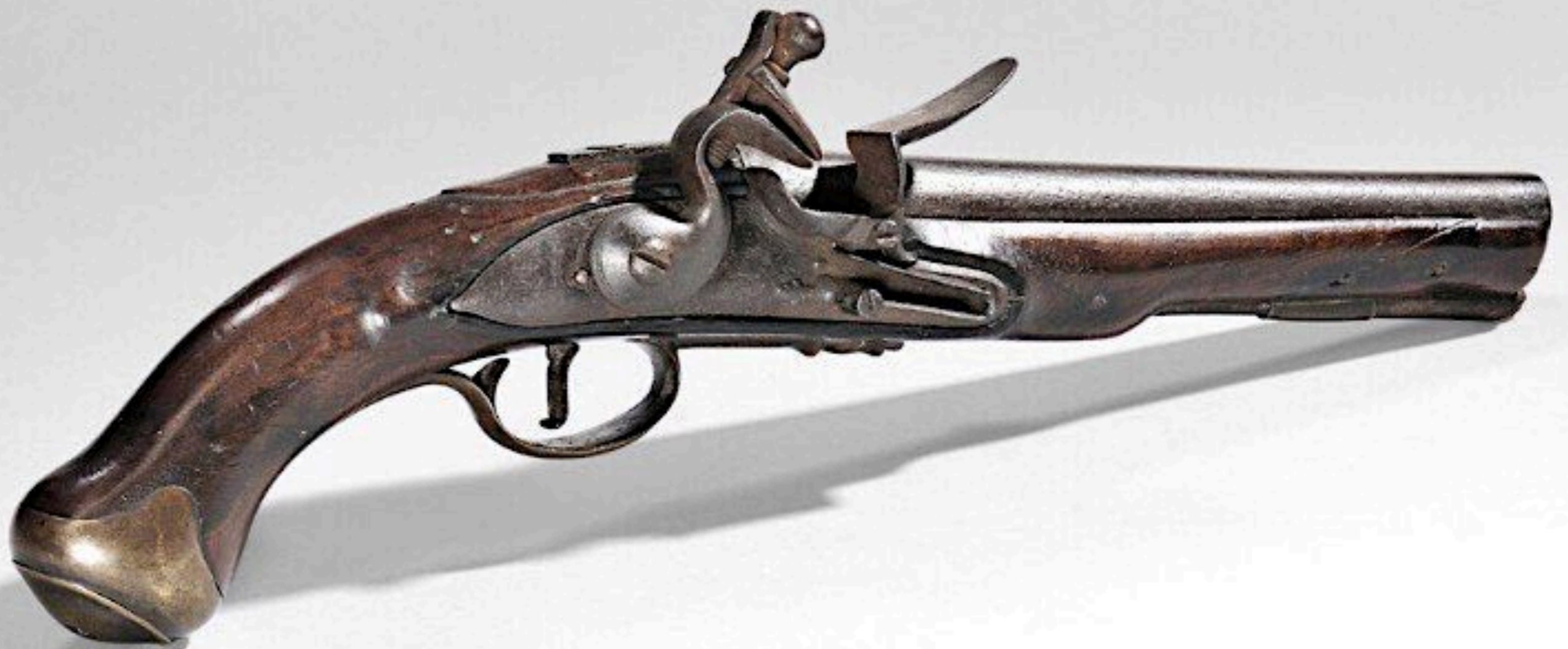
English Light Dragoon Pistol Marked "GALTON/1760" 1760 (Skinner)