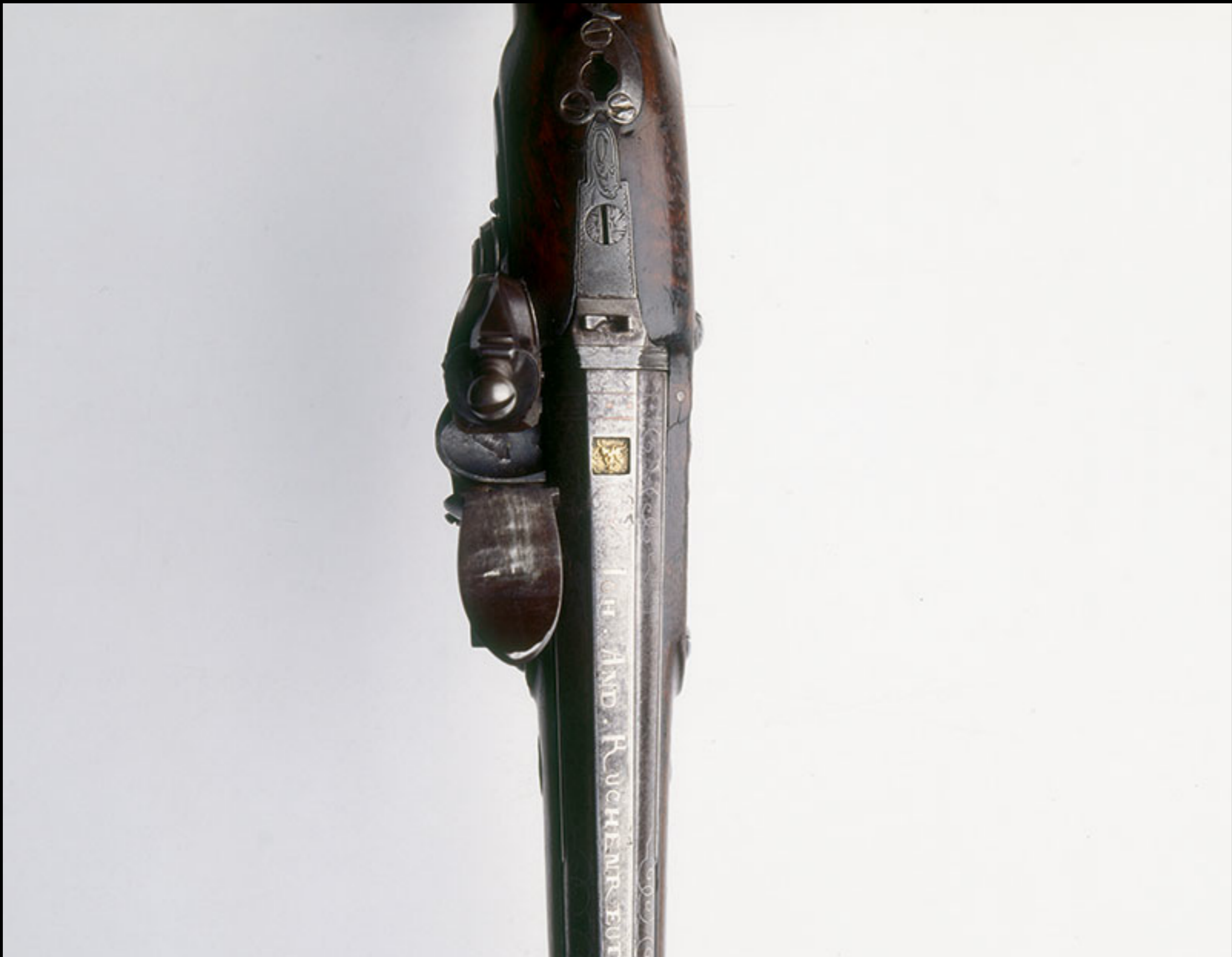
English Holster Pistols Owned by Brigadier General John Peter Muhlenberg of Pennsylvania Mid 18th Century