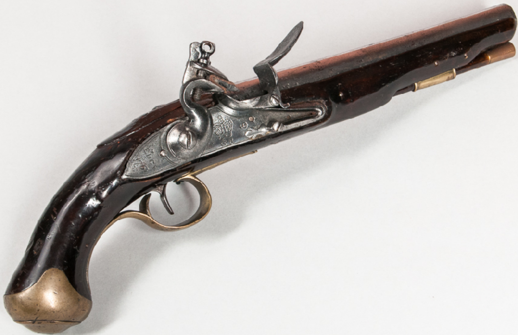
English Pattern 1759 Light Dragoon Pistol Marked "EDGE/1761" 1761