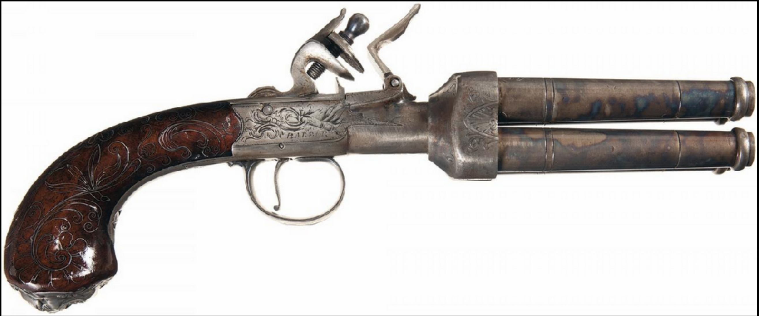
English Four Barrel Pistol Marked "BARBAR, LONDON" 18th Century (Private Collection)