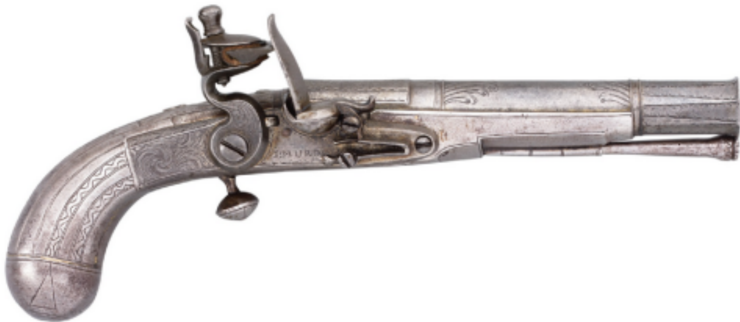
Scottish Pistol Marked "MURDOCH" c. 1780 (Private Collection)