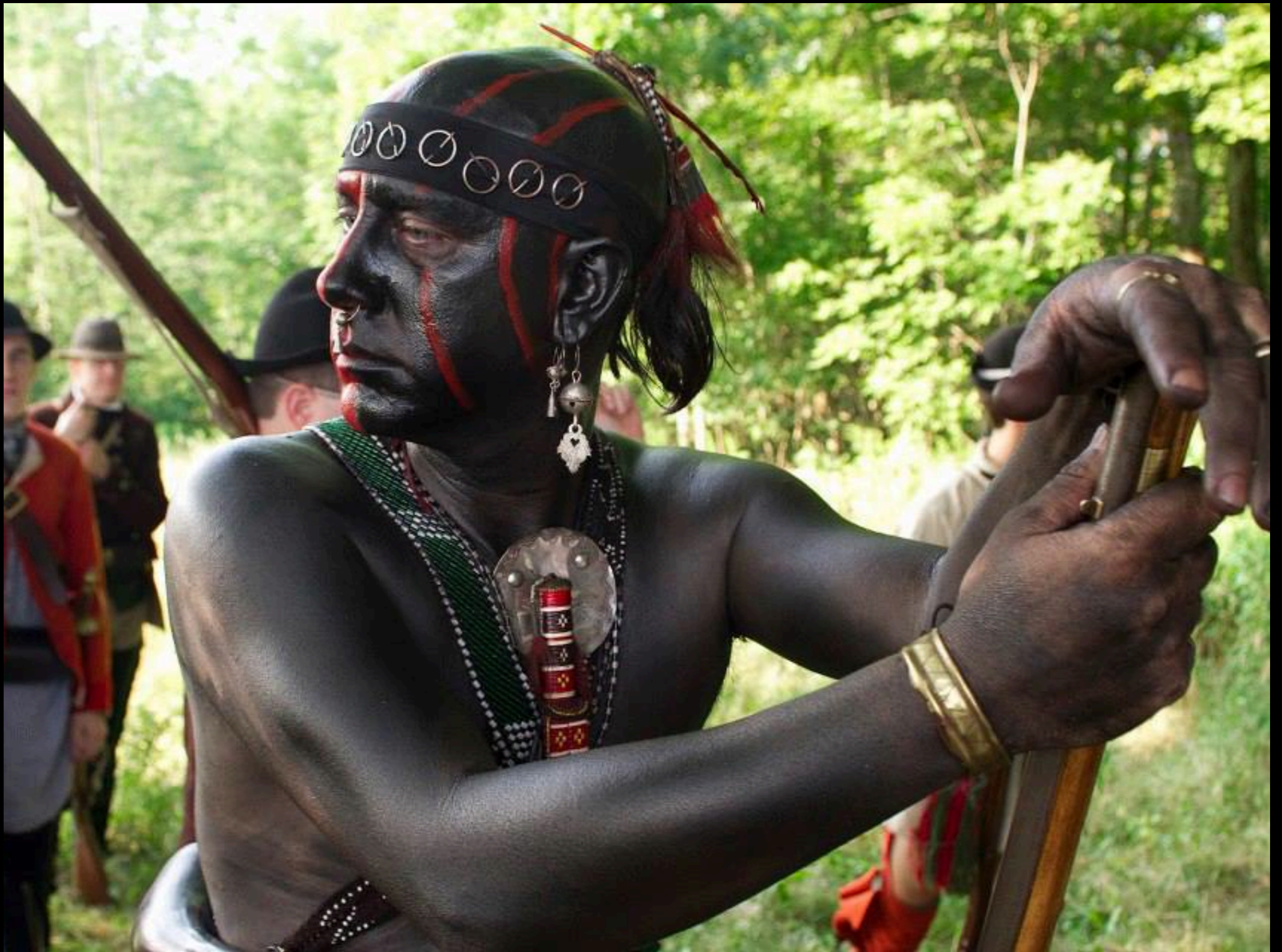
Captain Bull's War Party, Recreated