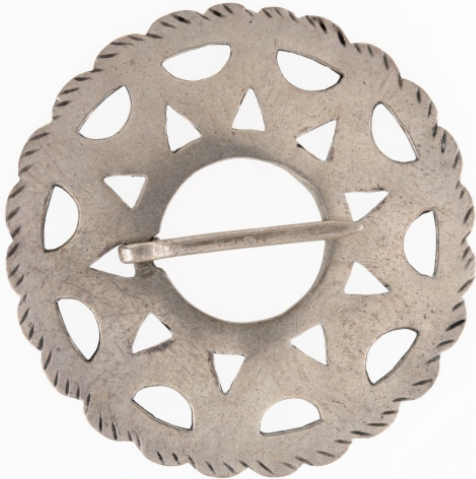
Eastern Woodlands Trade Silver Brooch c. 1780 - 1830 (McCord Museum)