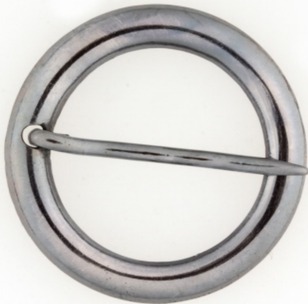
Eastern Woodlands Trade Silver Brooch c. 1780 - 1830 (McCord Museum)