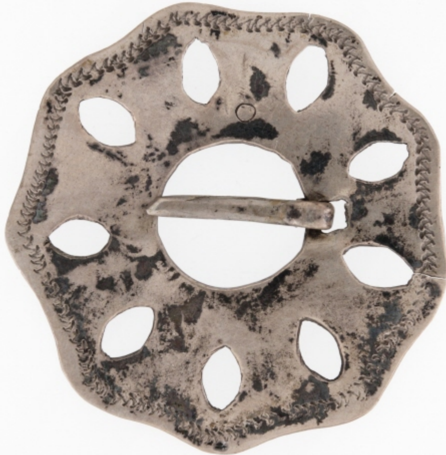
Eastern Woodlands Trade Silver Brooch c. 1780 - 1830 (McCord Museum)