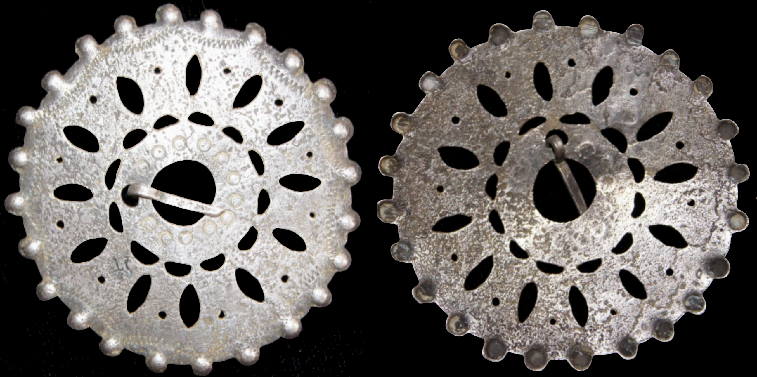
Iroquois Repousse & Rocker Engraved Trade Silver Brooch Hallmarked "A" c. 1750 - 1830