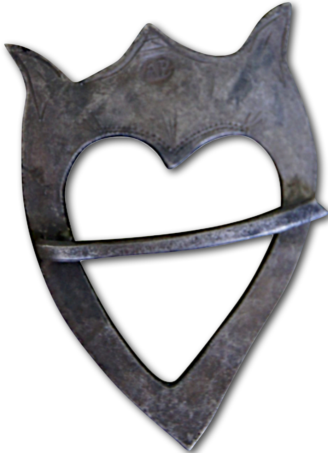
Iroquois Trade Silver Brooch Hallmarked "AB" c. 1750 - 1830