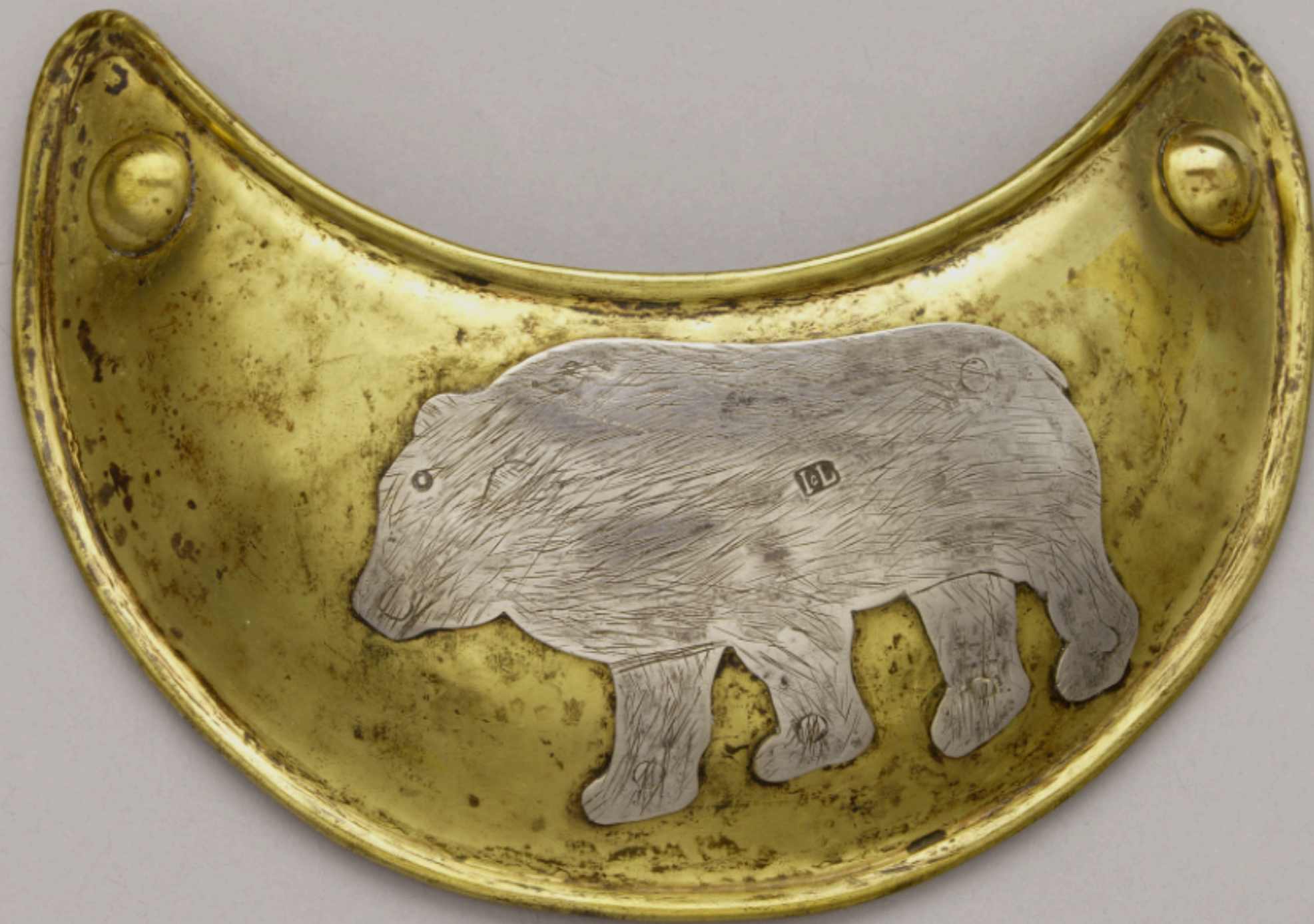
Native American Brass & Silver Trade Gorget Made in Albany, New York Mid 18th Century (American Revolution Museum at Yorktown)