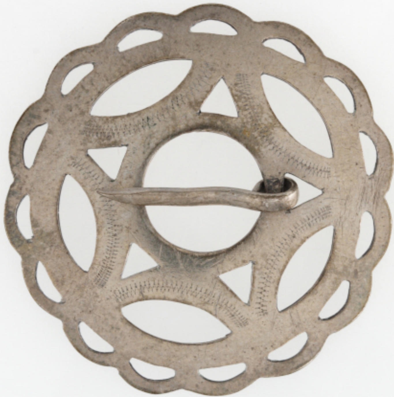
Eastern Woodlands Trade Silver Brooch c. 1780 - 1830 (McCord Museum)