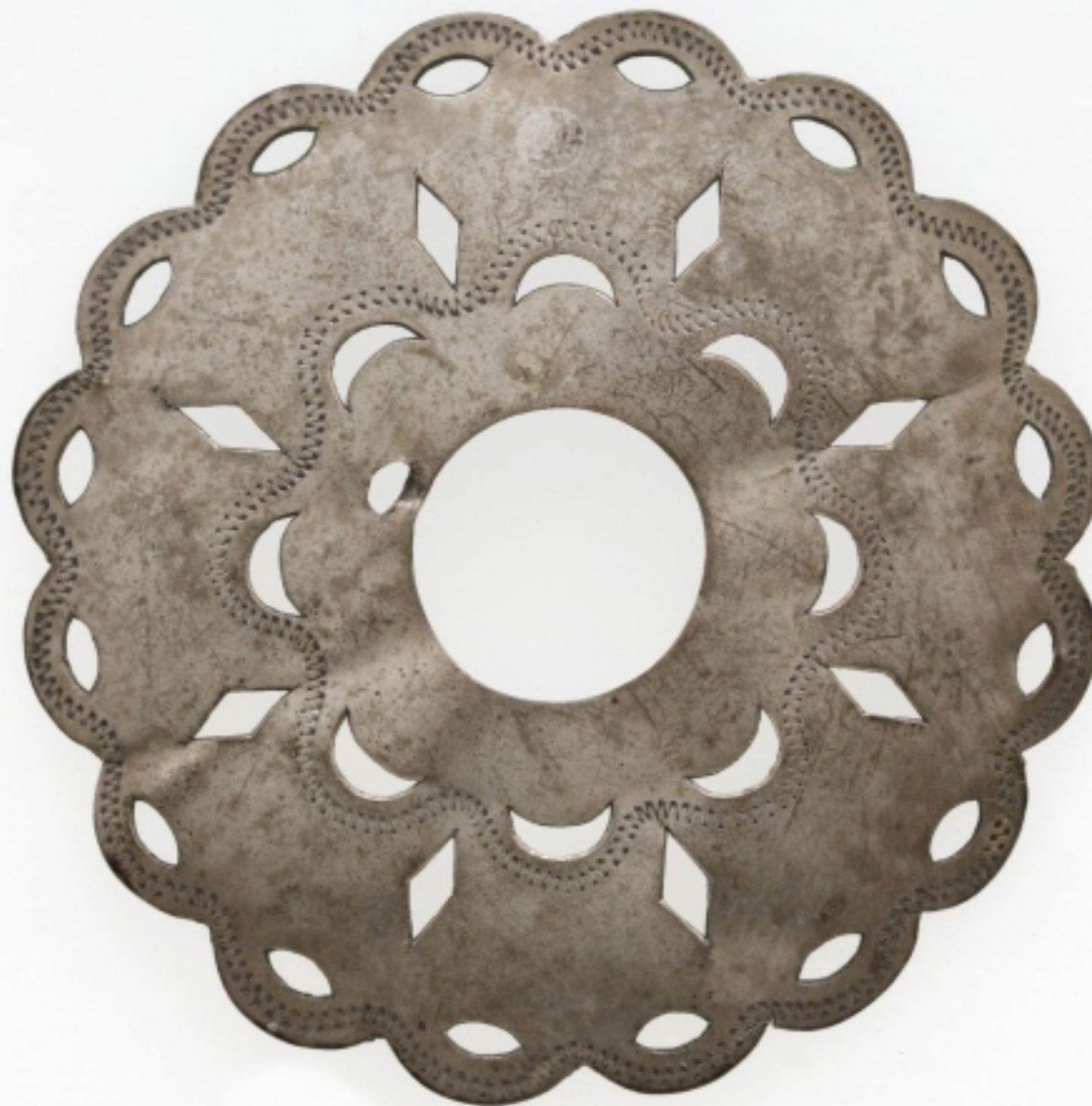
Eastern Woodlands, Iroquois, Trade Silver Brooch c. 1780 - 1830 (McCord Museum)