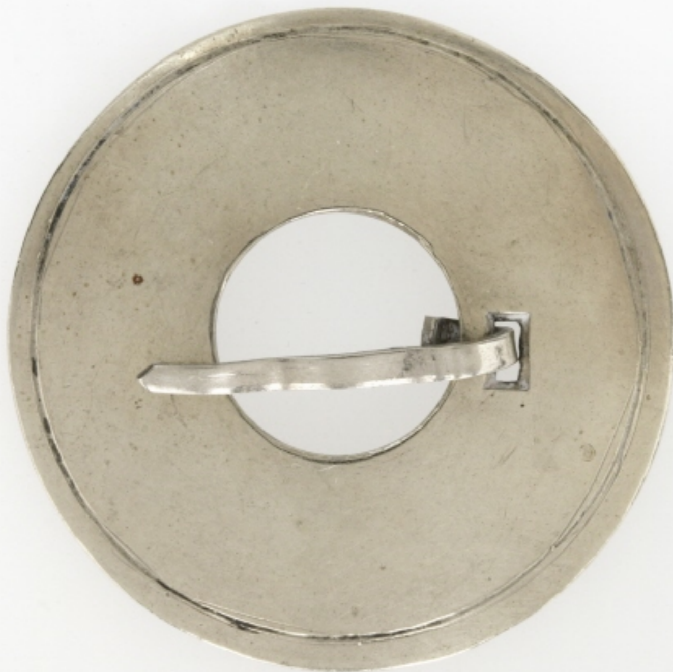
Eastern Woodlands, Iroquois, German Trade Silver Brooch c. 1780 - 1830 (McCord Museum)