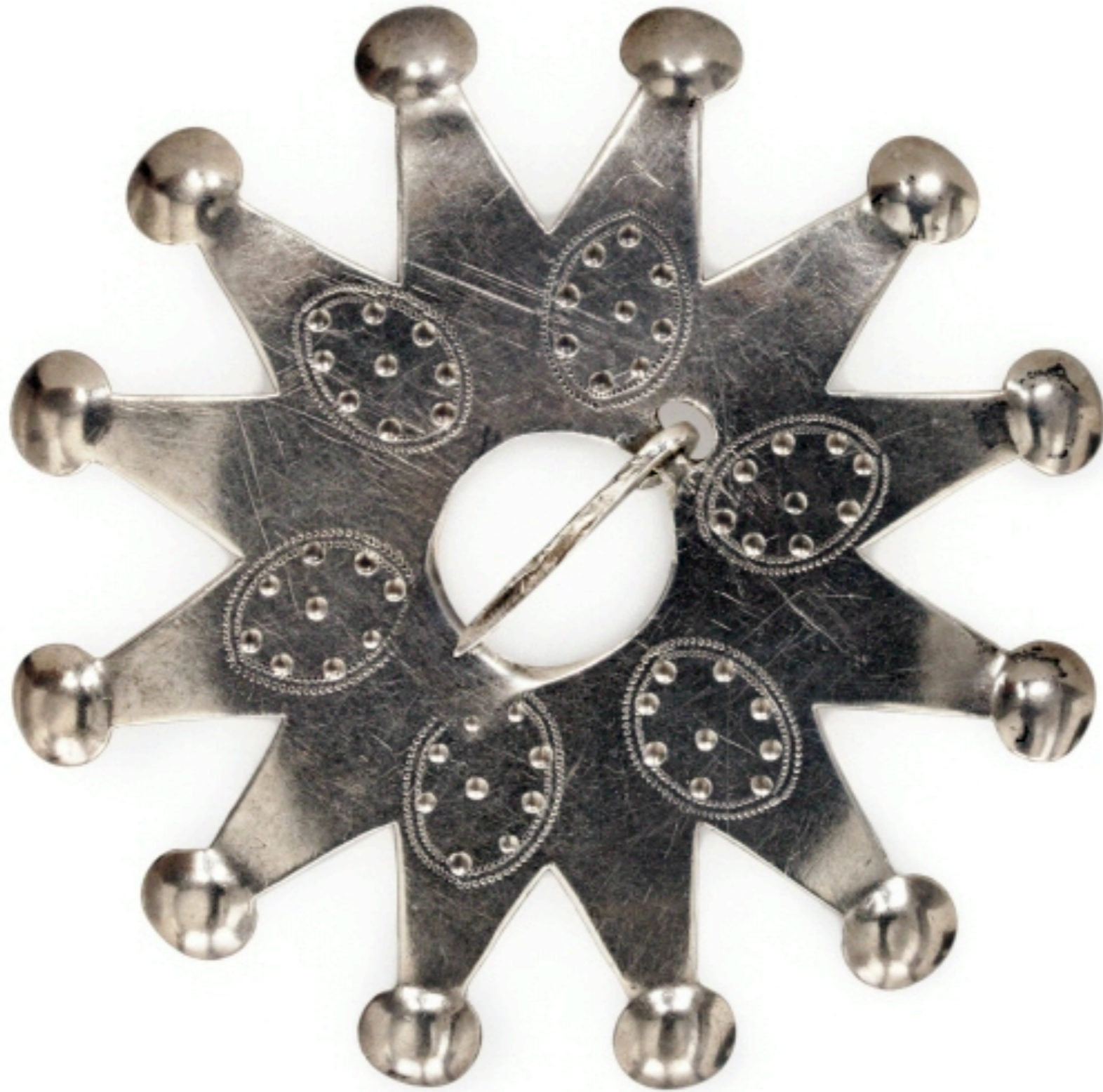
Northeast Woodlands Trade Silver Star Brooch c. 1780 - 1830 (McCord Museum)