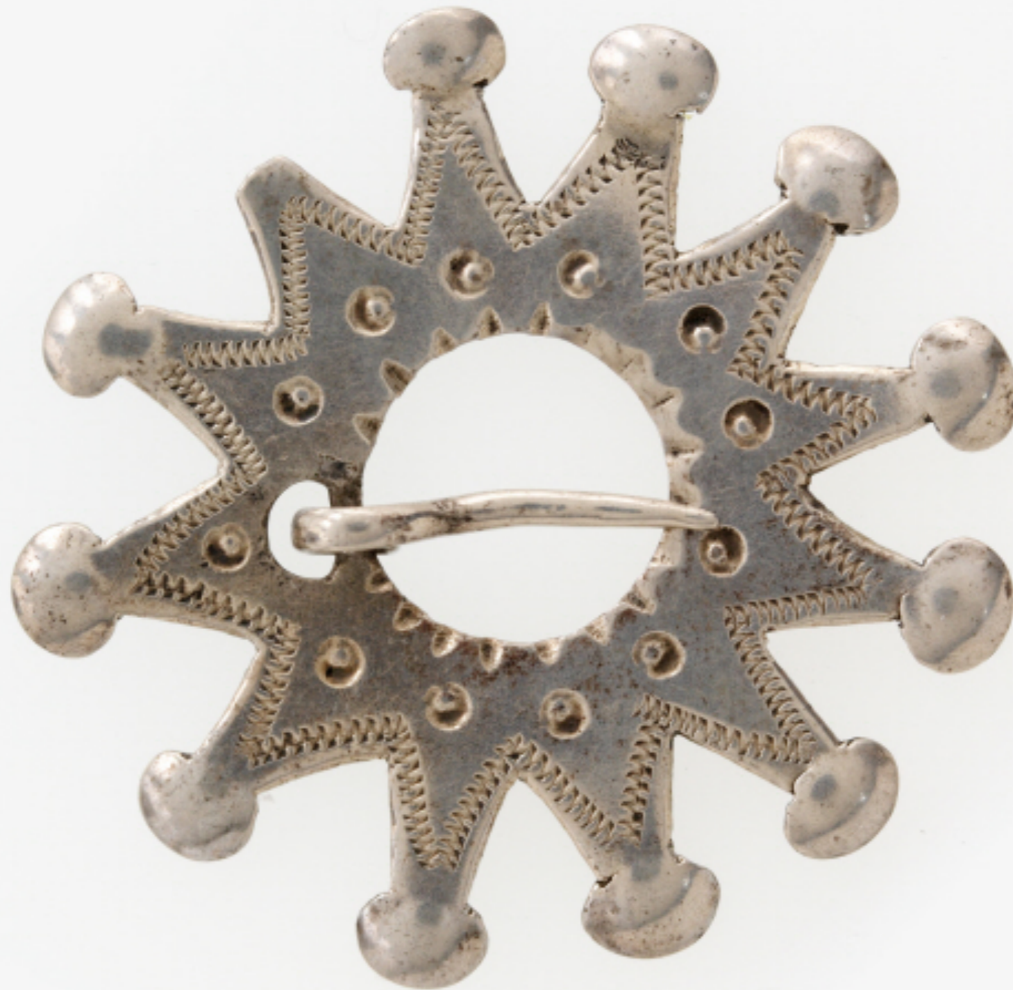
Northeast Woodlands Trade Silver Star Brooch c. 1780 - 1830 (McCord Museum)