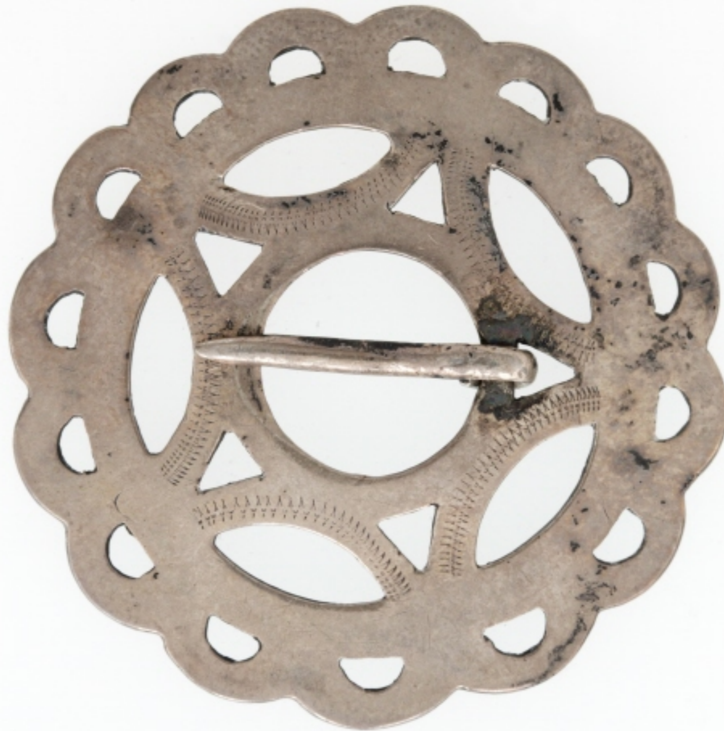
Eastern Woodlands Trade Silver Brooch c. 1780 - 1830 (McCord Museum)