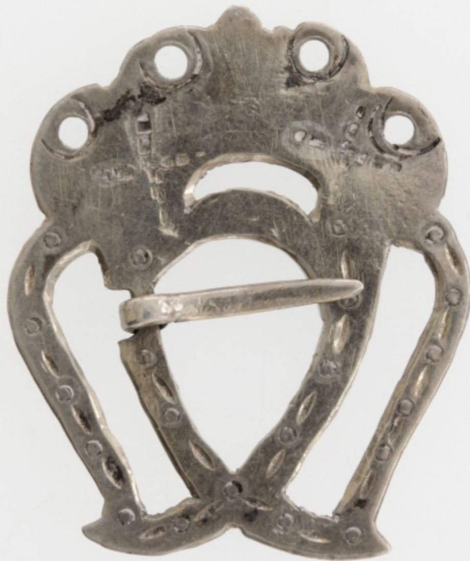
Eastern Woodlands Trade Silver Brooch c. 1780 - 1830 (McCord Museum)