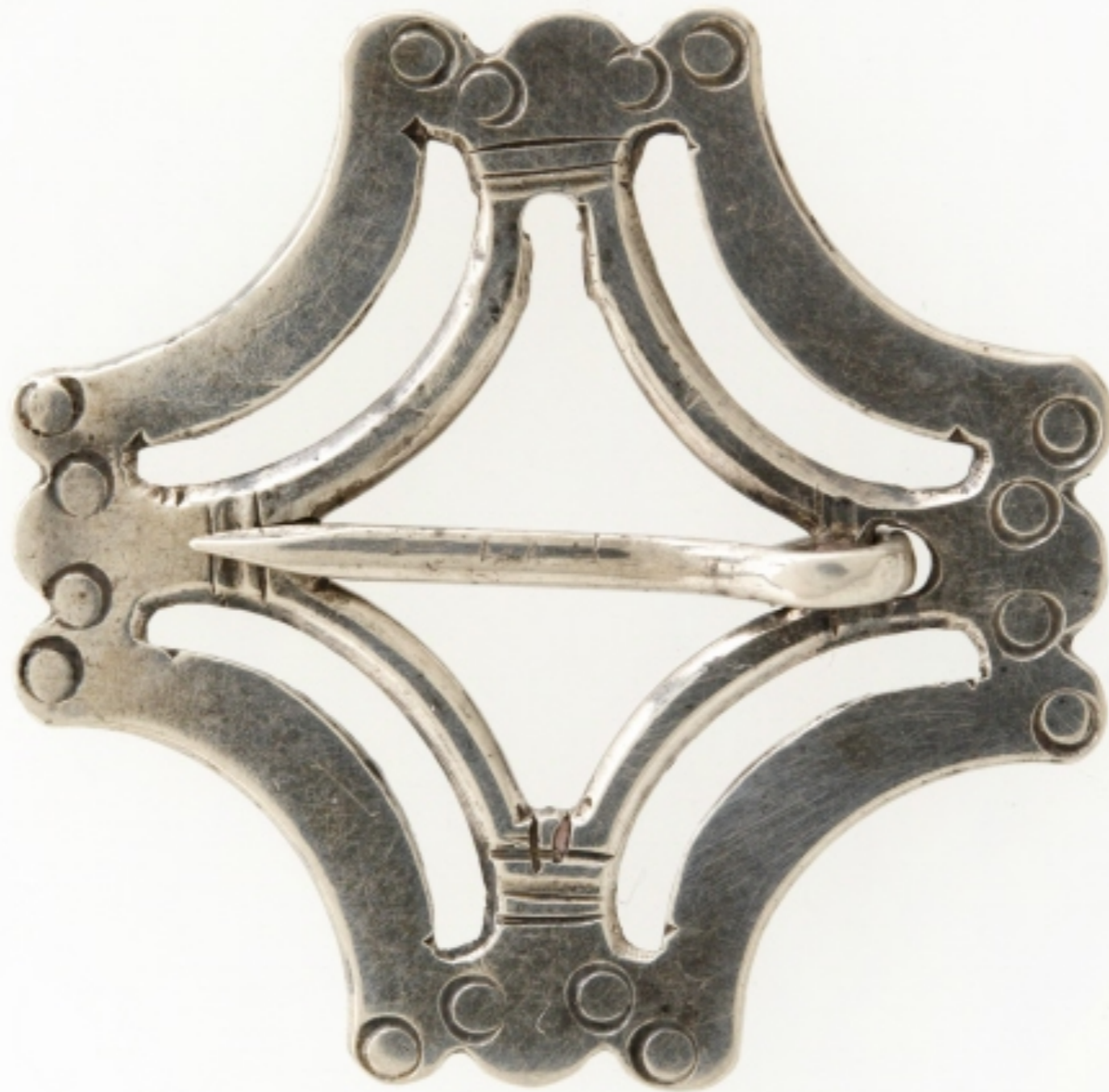
Eastern Woodlands Trade Silver Council Square Brooch c. 1780 - 1830 (McCord Museum)