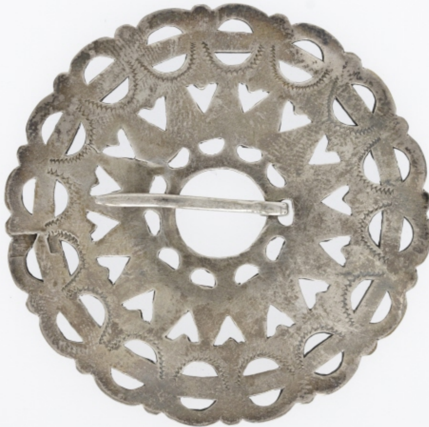
Eastern Woodlands, Iroquois, Trade Silver Brooch c. 1780 - 1830 (McCord Museum)