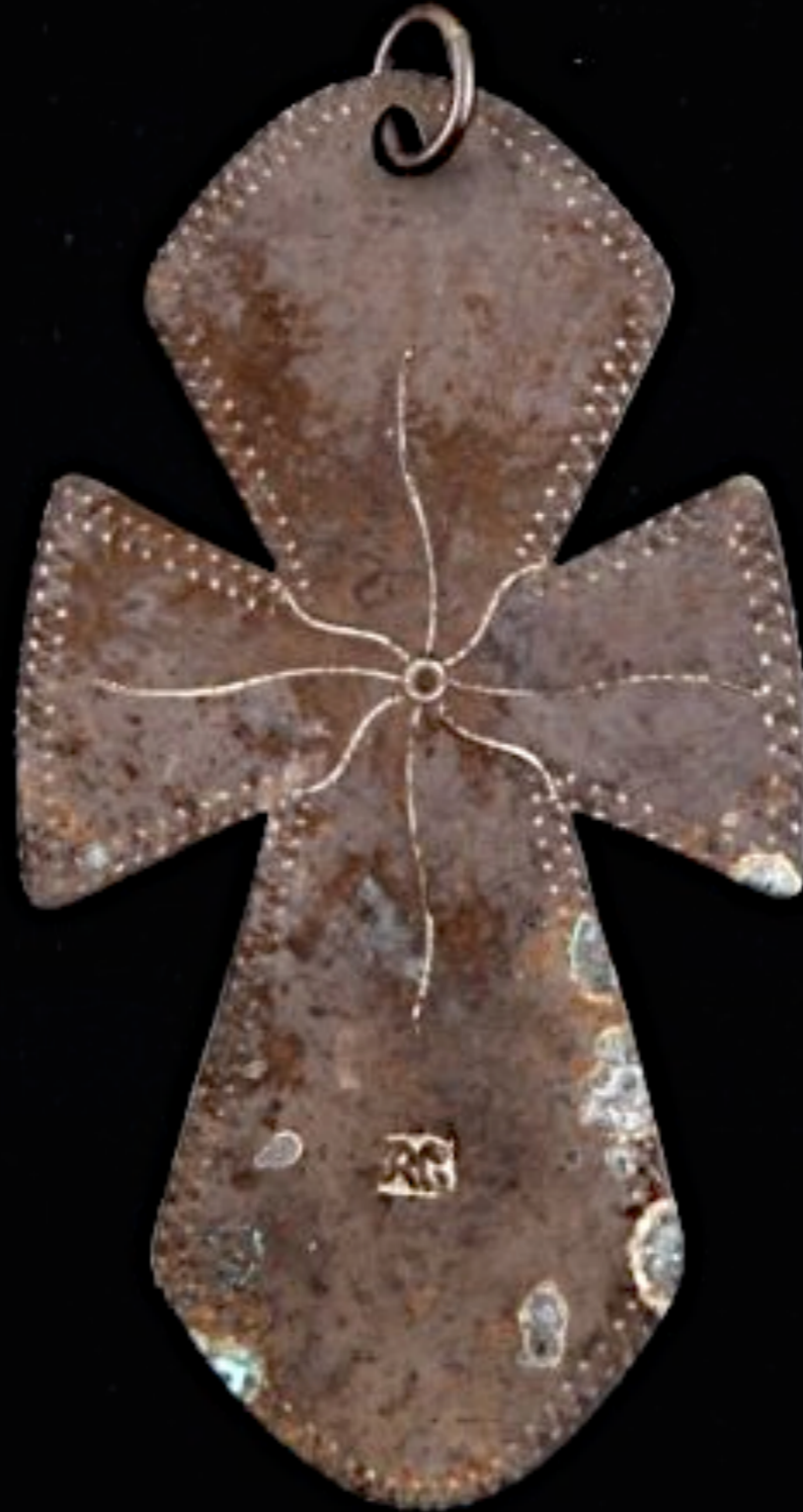
Native American Trade Silver Cross Hallmarked "RC" for Robert Cruickshank of Montreal, Quebec 18th Century (Private Collection)