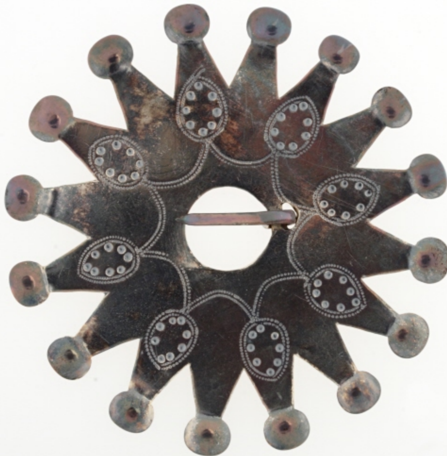
Northeast Woodlands Trade Silver Star Brooch