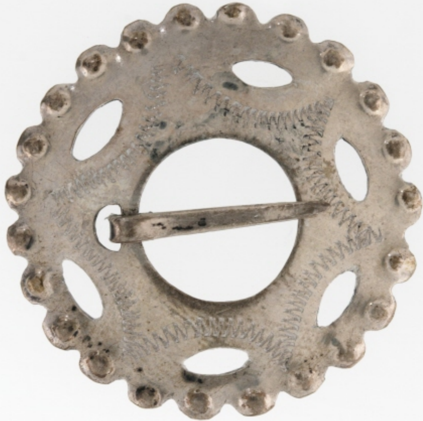
Eastern Woodlands Trade Silver Brooch c. 1780 - 1830 (McCord Museum)