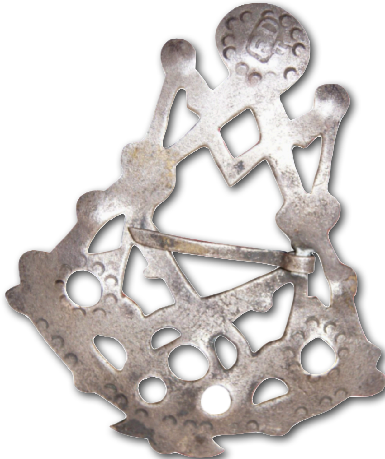
Eastern Woodlands Iroquois Masonic Style "Counsel Fire" Trade Silver Brooch Hallmarked "EDT" c. 1750 - 1830