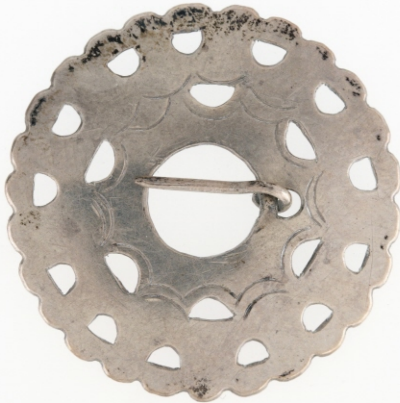
Eastern Woodlands Trade Silver Brooch c. 1780 - 1830 (McCord Museum)