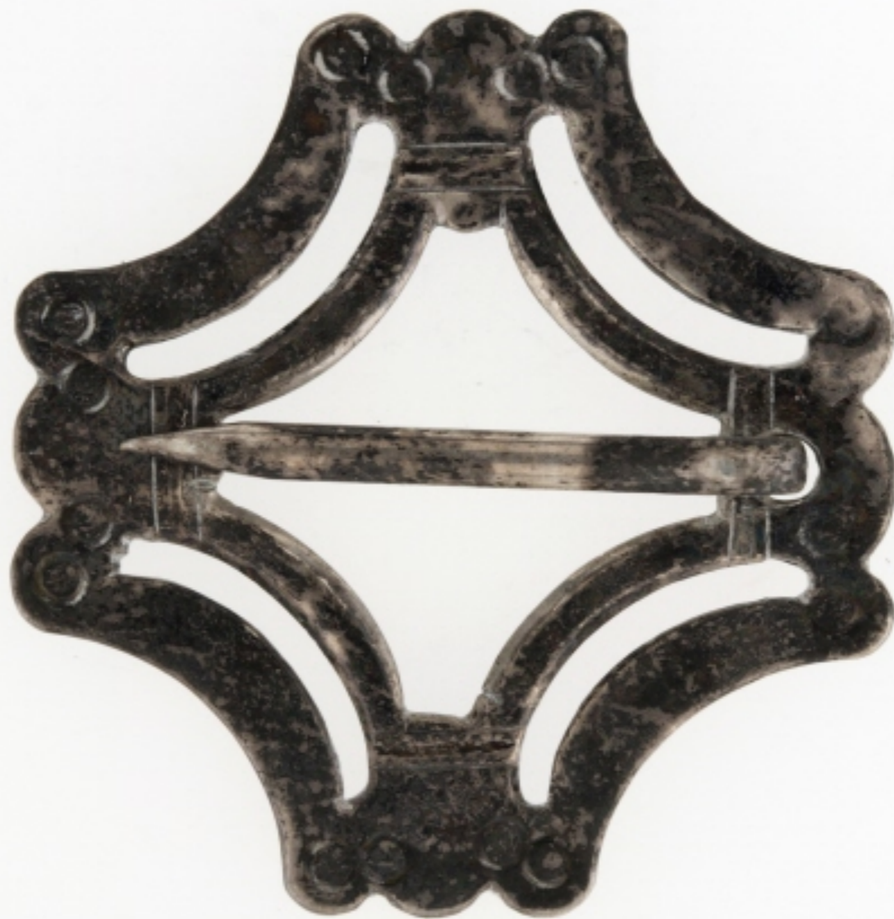
Eastern Woodlands Trade Silver Council Square Brooch c. 1780 - 1830 (McCord Museum)