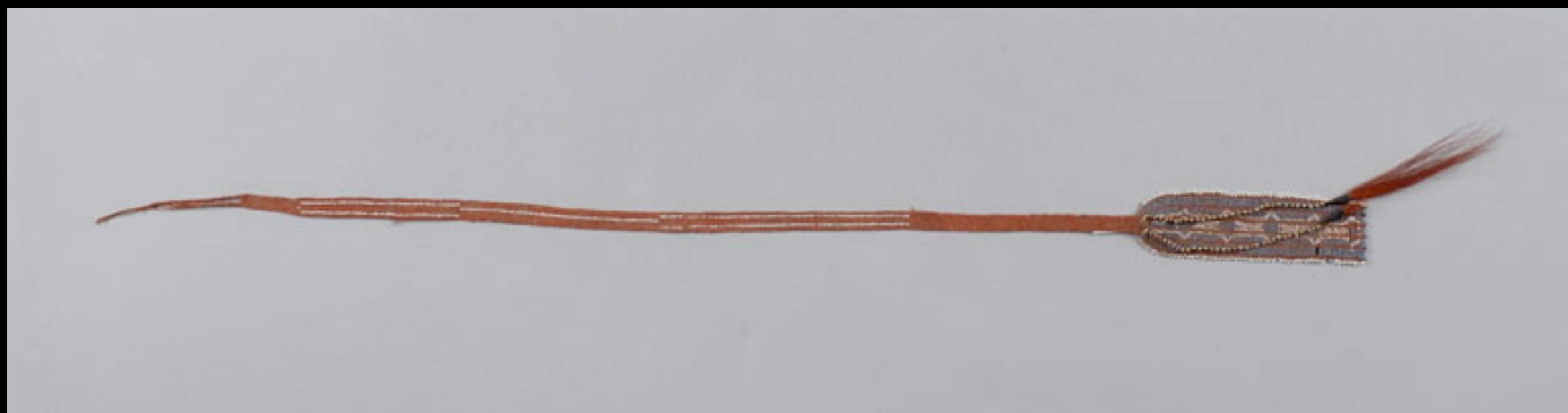
Eastern Woodlands Hair Ornament Collected by Lieutenant, Sir John Caldwell, of H.M. 8th Regiment of Foot c. 1780 (Canadian Museum of History - Speyer Collection)