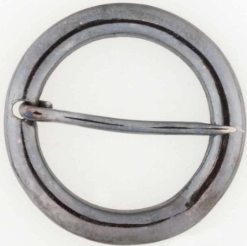
Eastern Woodlands Trade Silver Brooch c. 1780 - 1830 (McCord Museum)