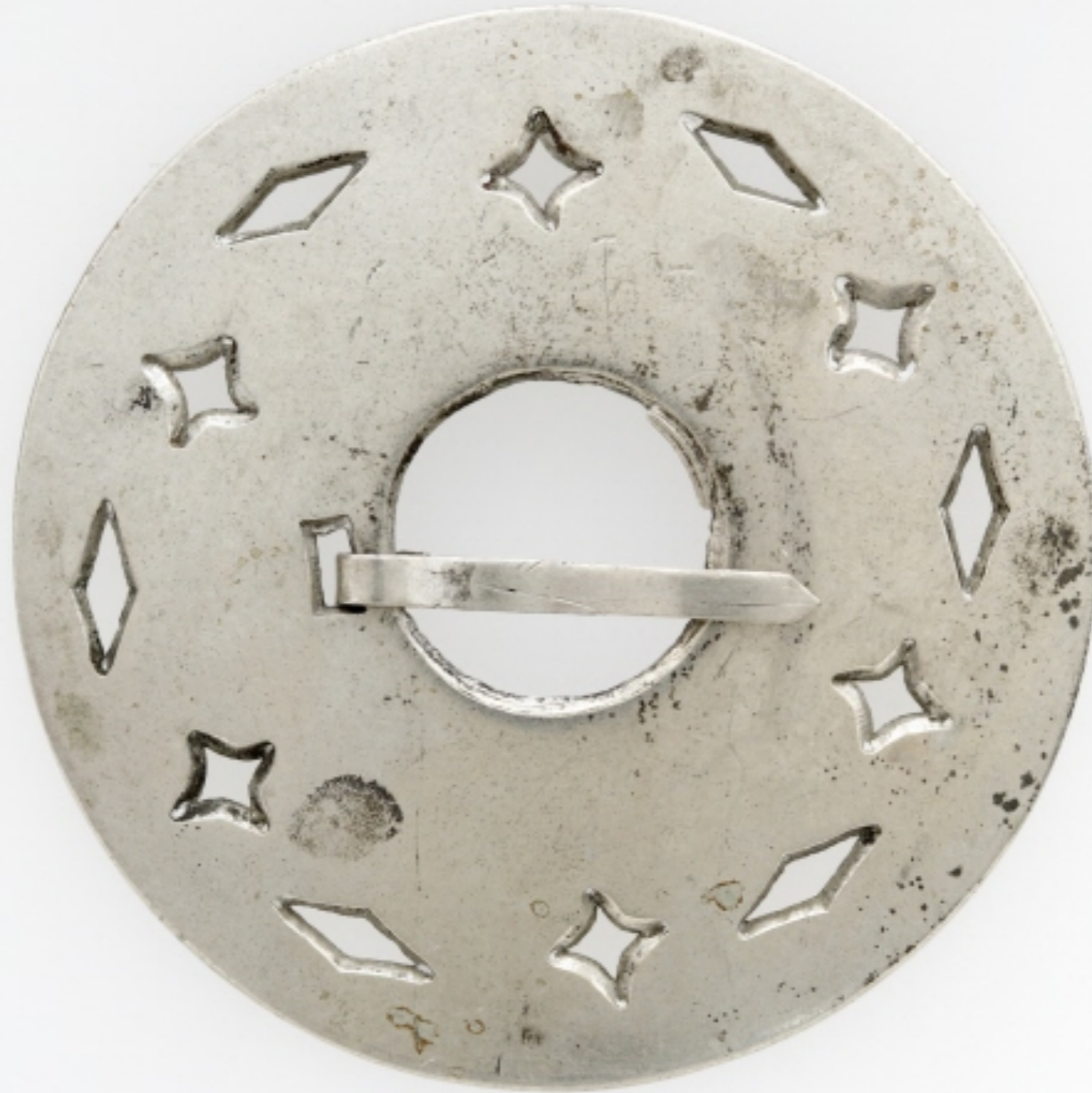
Eastern Woodlands, Iroquois, German Trade Silver Brooch c. 1780 - 1830