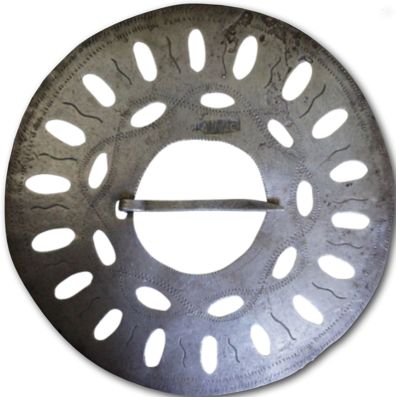
Iroquois Trade Silver Brooch Engraved "MUNRO"