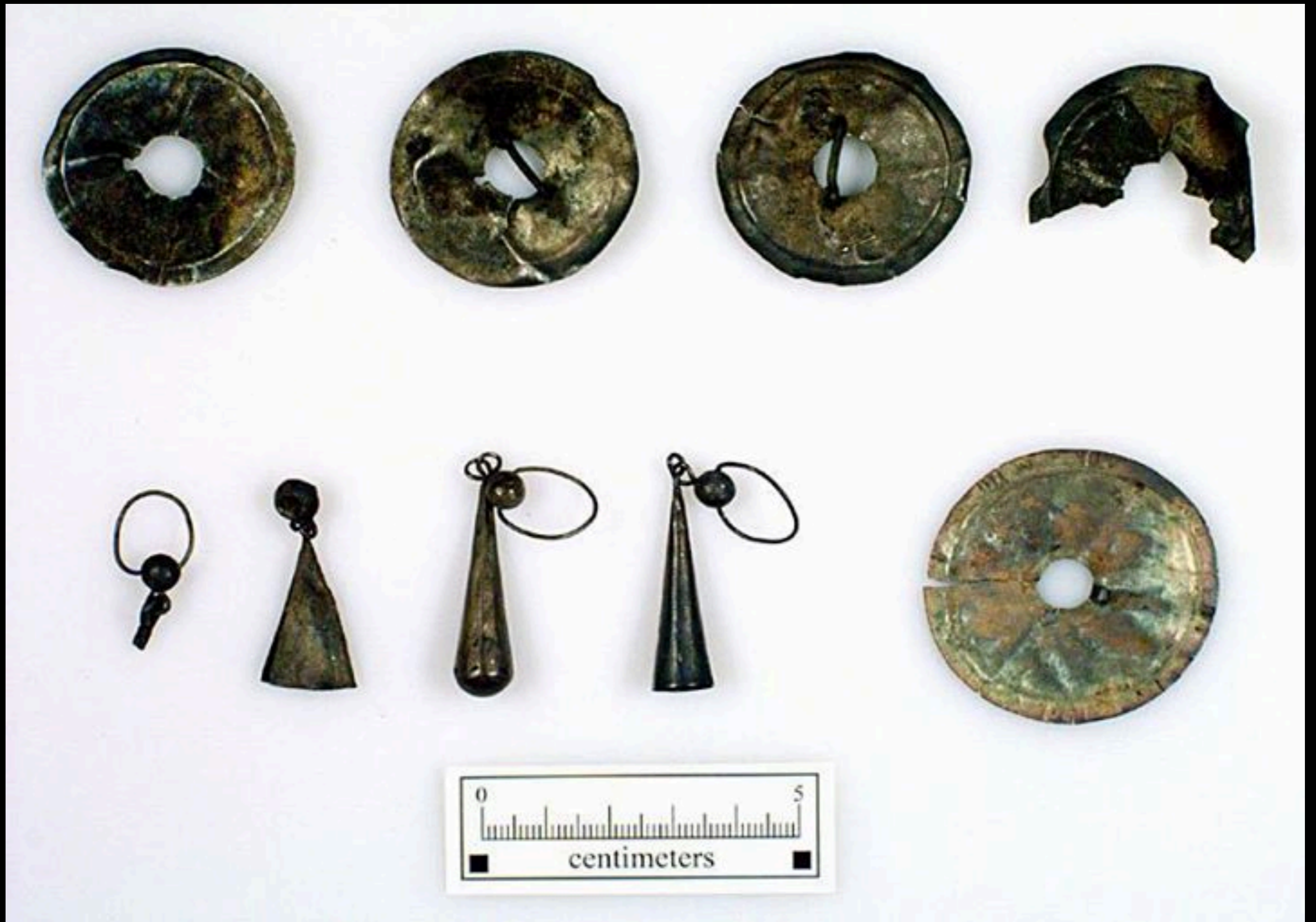
Cherokee Trade Silver Mid 18th Century (University of North Carolina, Chapel Hill)