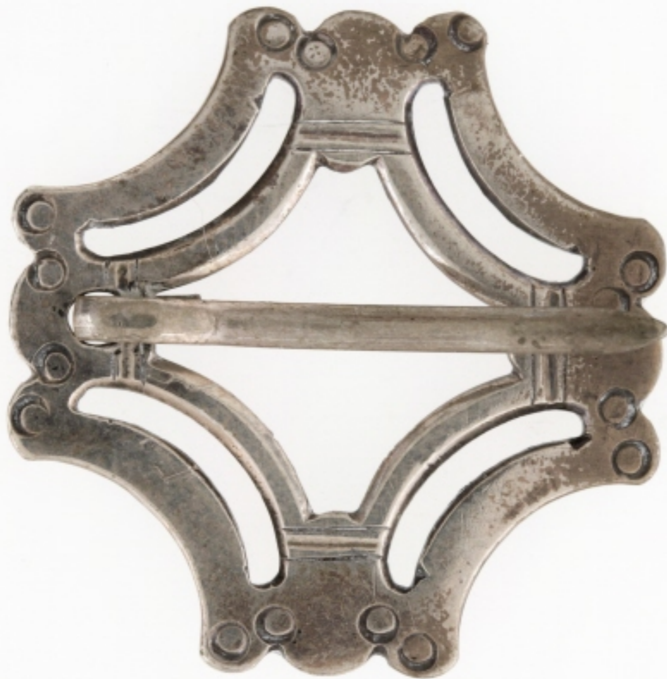
Eastern Woodlands Trade Silver Council Square Brooch