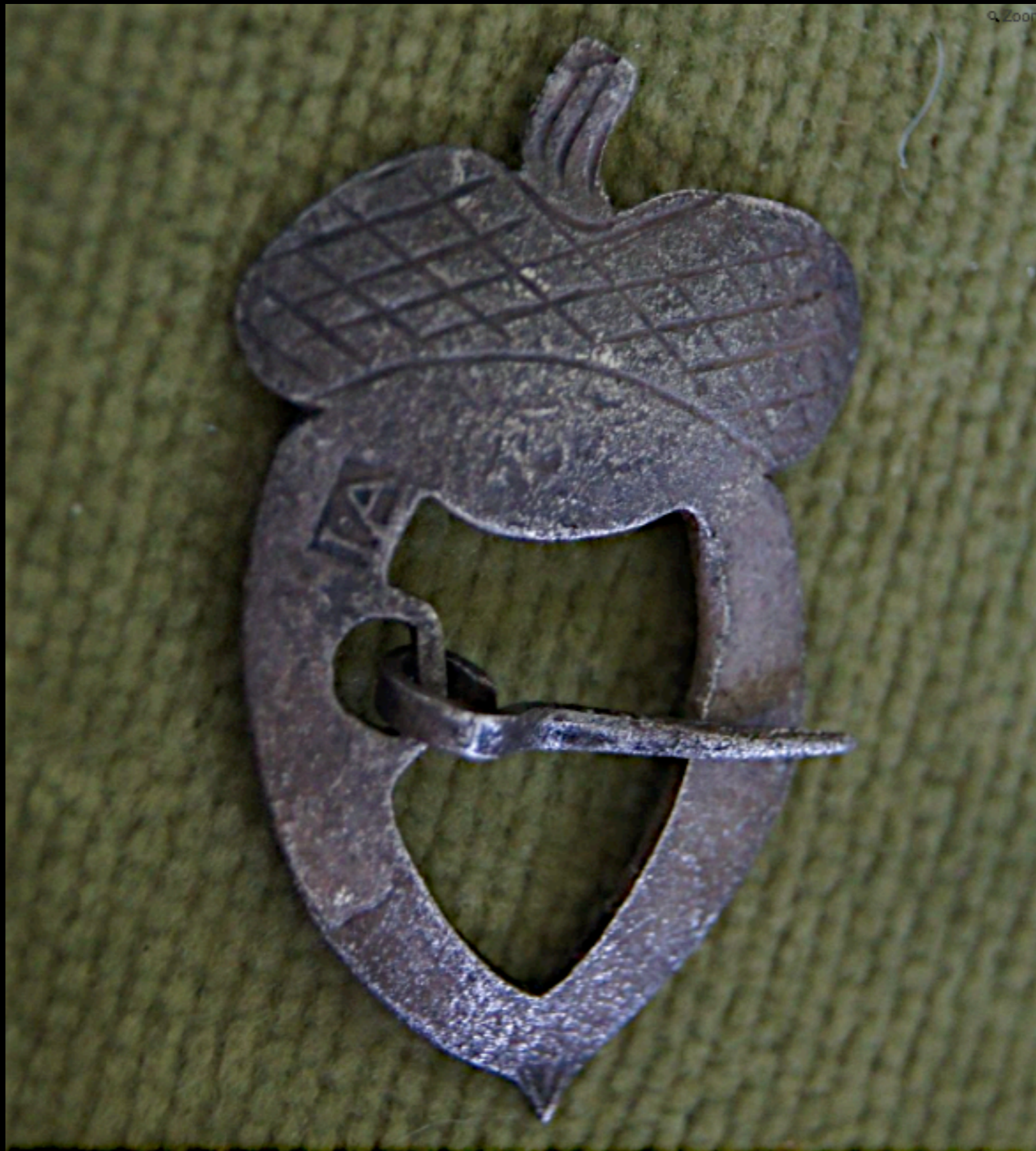
Iroquois Trade Silver "Chestnut" Brooch Hallmarked "IA" c. 1750 - 1830