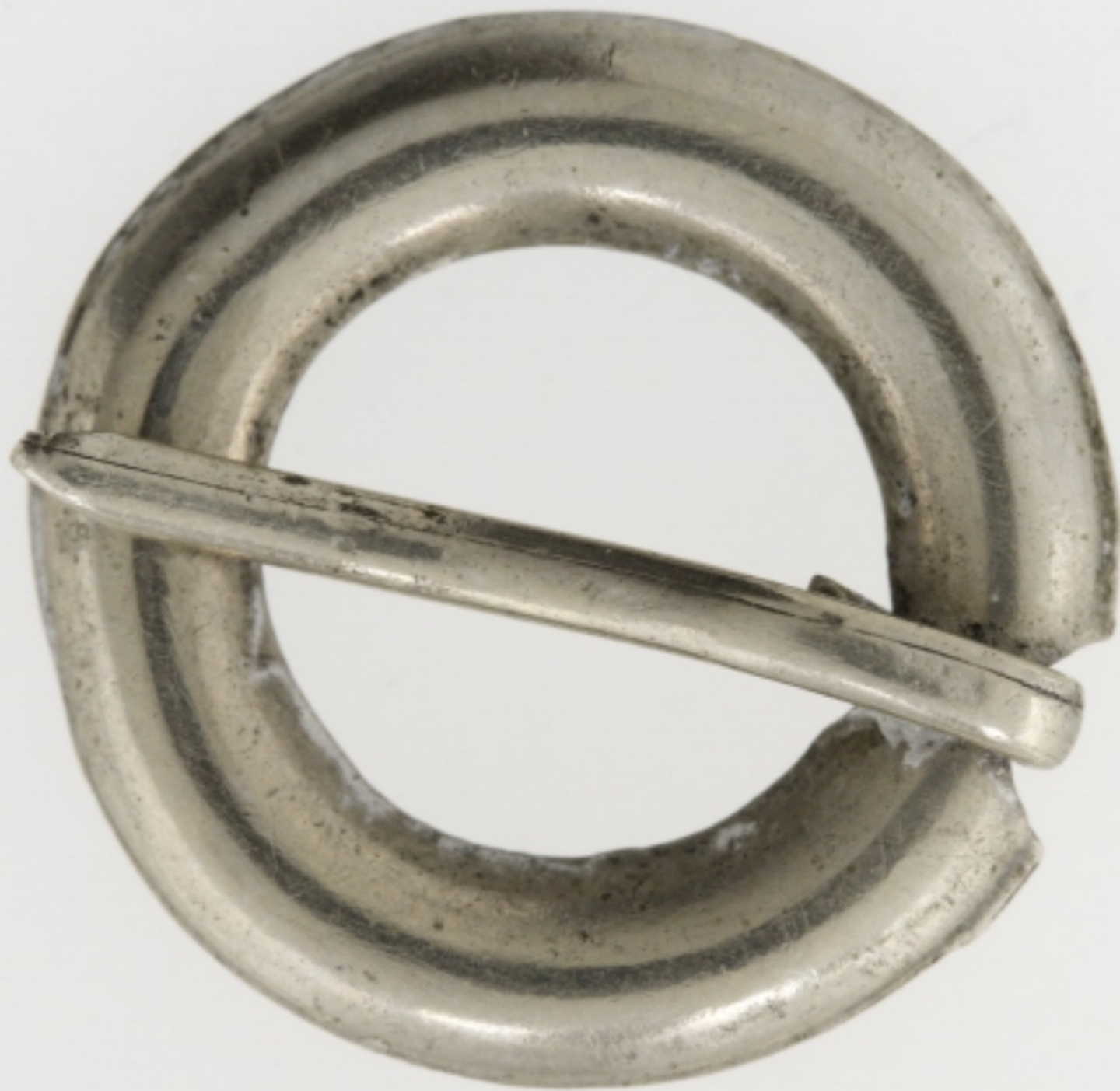
Eastern Woodlands Trade Silver Brooch c. 1780 - 1830 (McCord Museum)