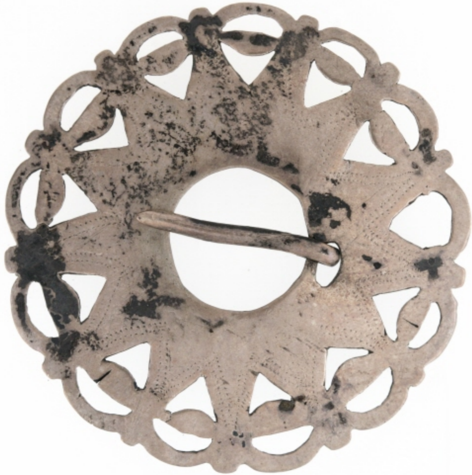
Eastern Woodlands Trade Silver Brooch c. 1780 - 1830 (McCord Museum)