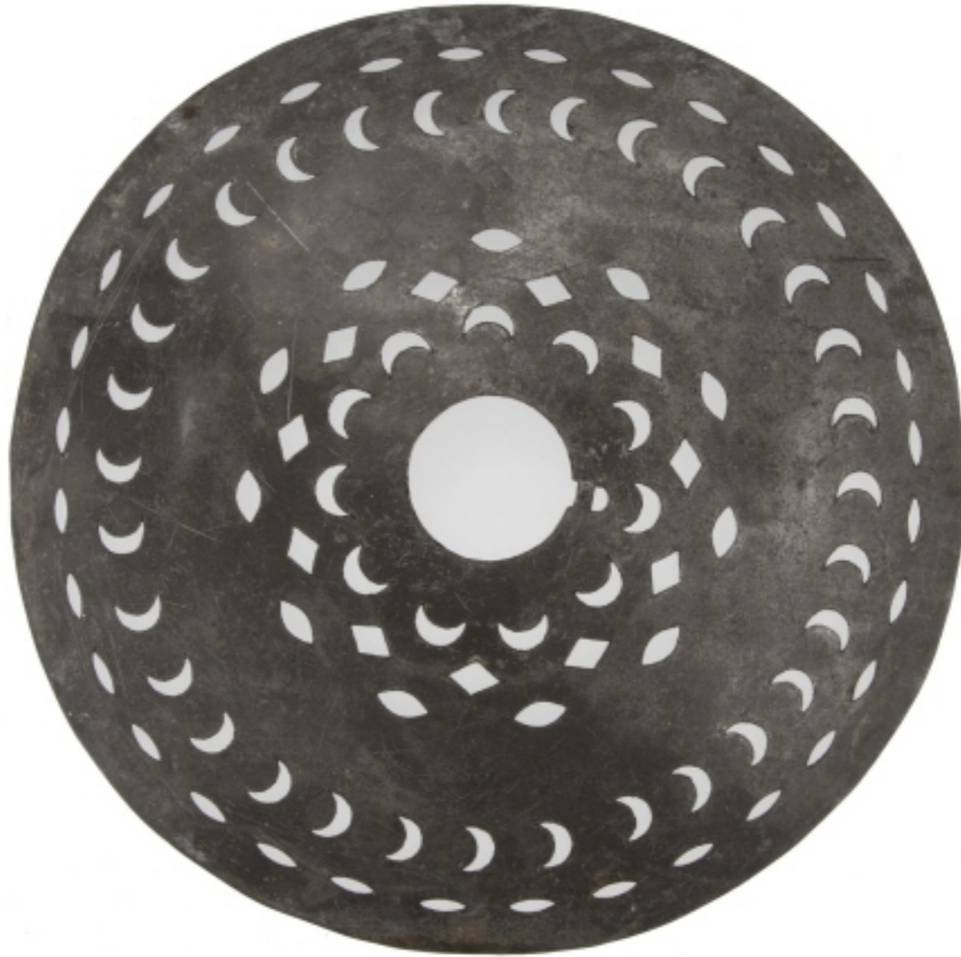
Eastern Woodlands Iroquois Tin Gorget c. 1780 - 1830