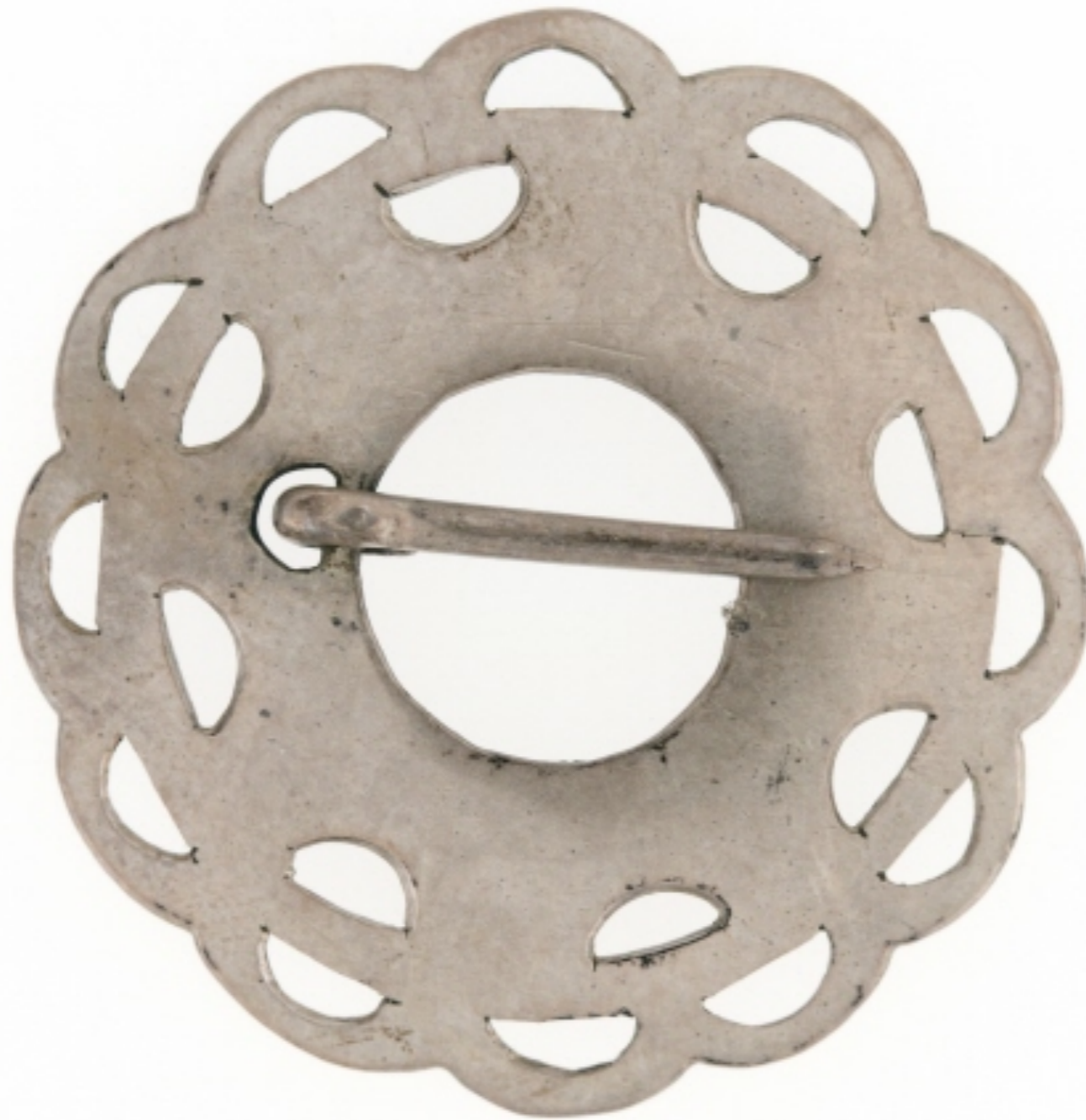
Eastern Woodlands Trade Silver Brooch c. 1780 - 1830