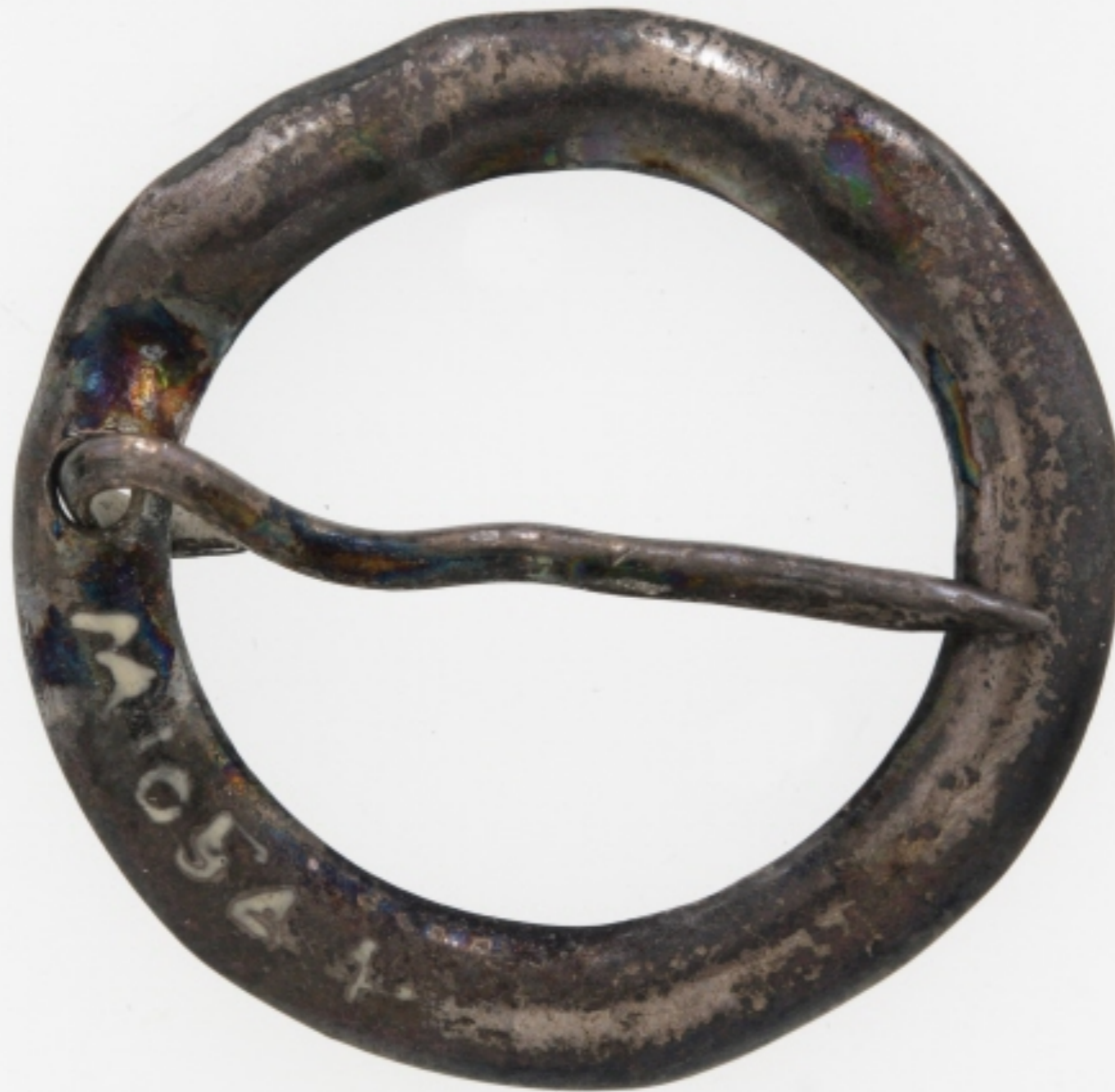
Eastern Woodlands, Iroquois, Trade Silver Brooch c. 1780 - 1830 (McCord Museum)