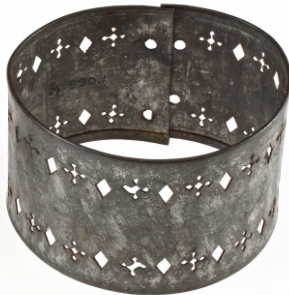
Eastern Woodlands, Iroquois or Mohawk, Tin - Plated Iron Alloy Armbands c. 1780 - 1830 (McCord Museum)