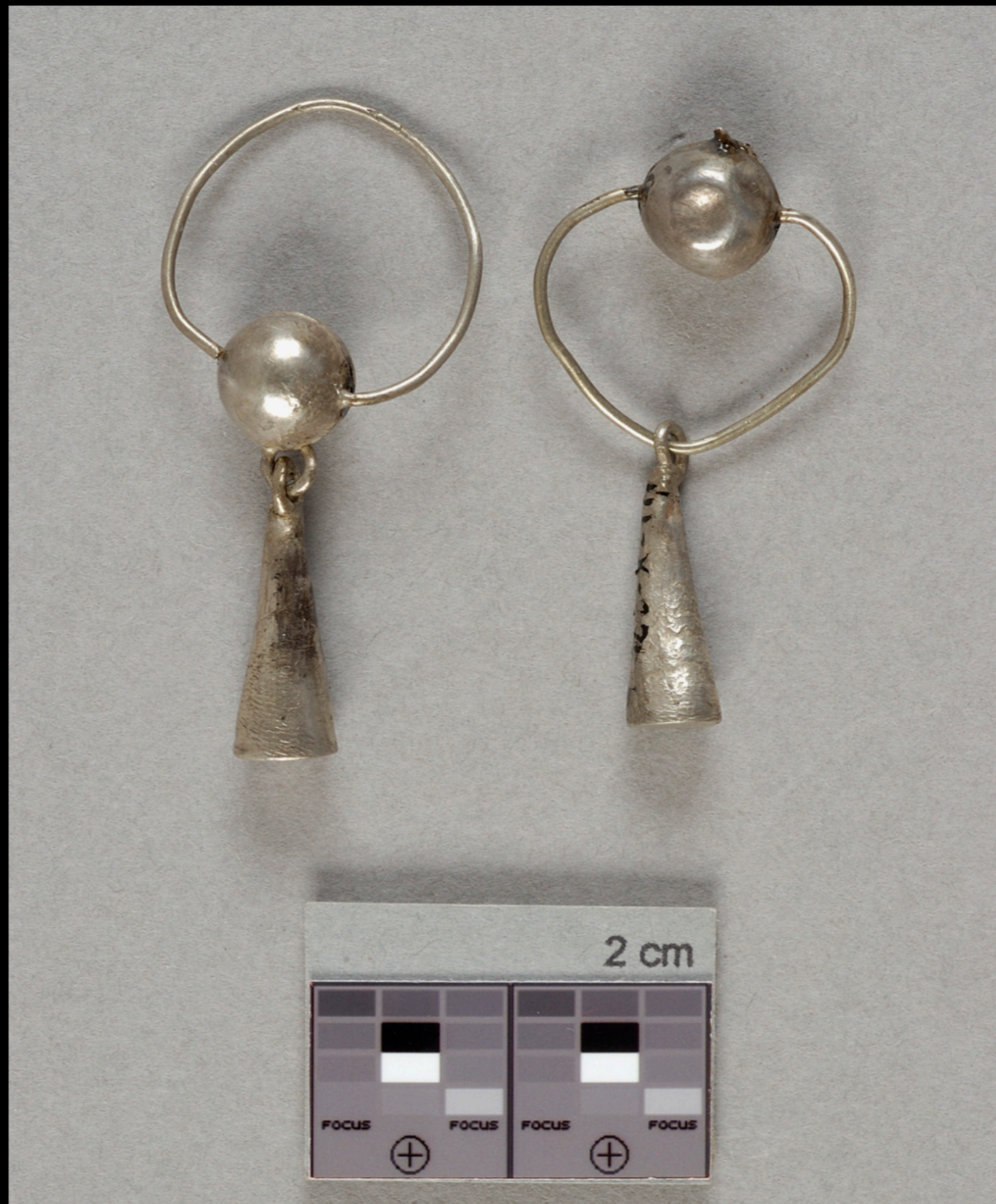
Eastern Woodlands Trade Silver Ear or Nose Pendants Collected & Worn by Lieutenant, Sir John Caldwell, of H.M. 8th Regiment of Foot c. 1780 (Canadian Museum of History - Speyer Collection)