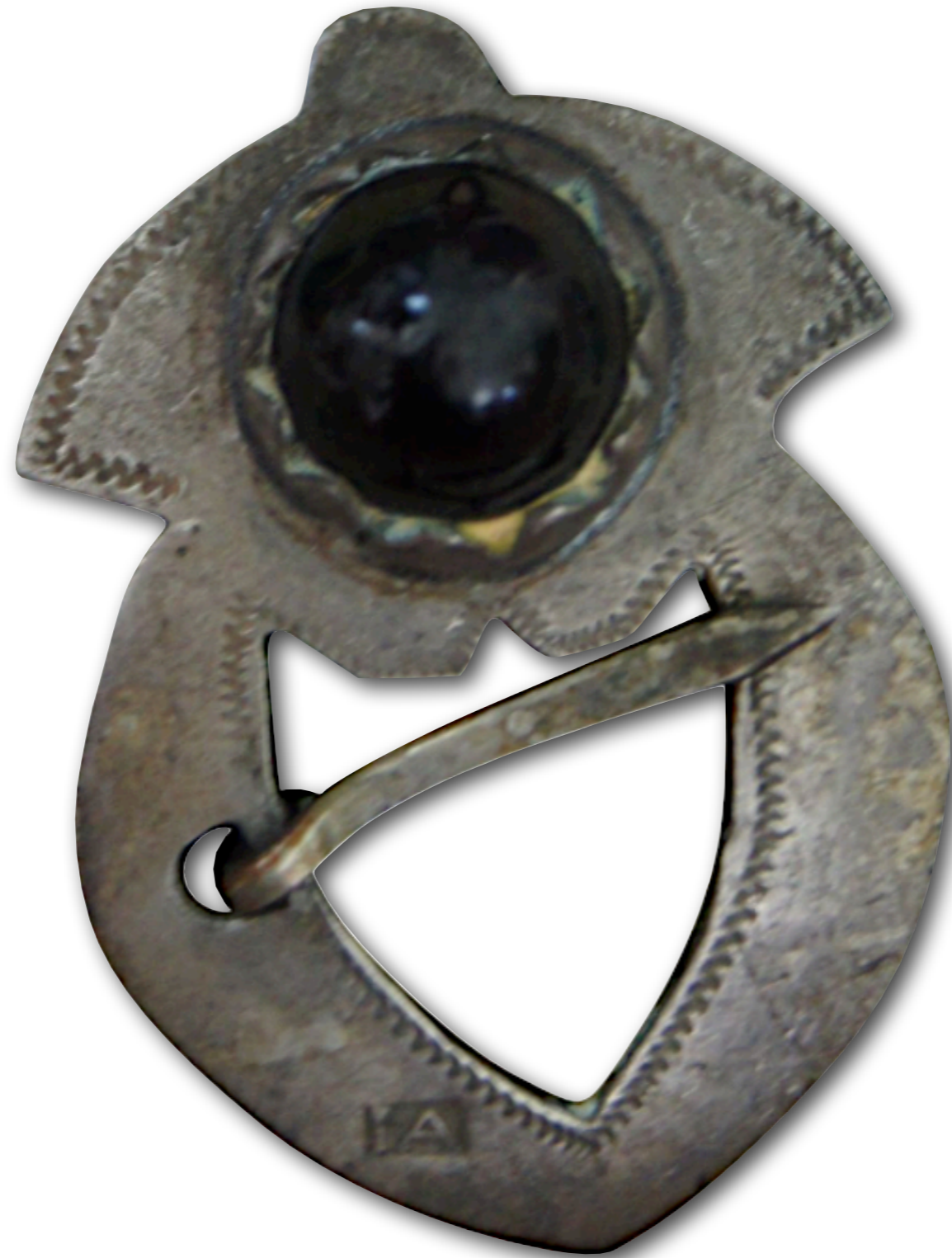
Iroquois Trade Silver Brooch with Black Glass Hallmarked "IA" c. 1750 - 1830