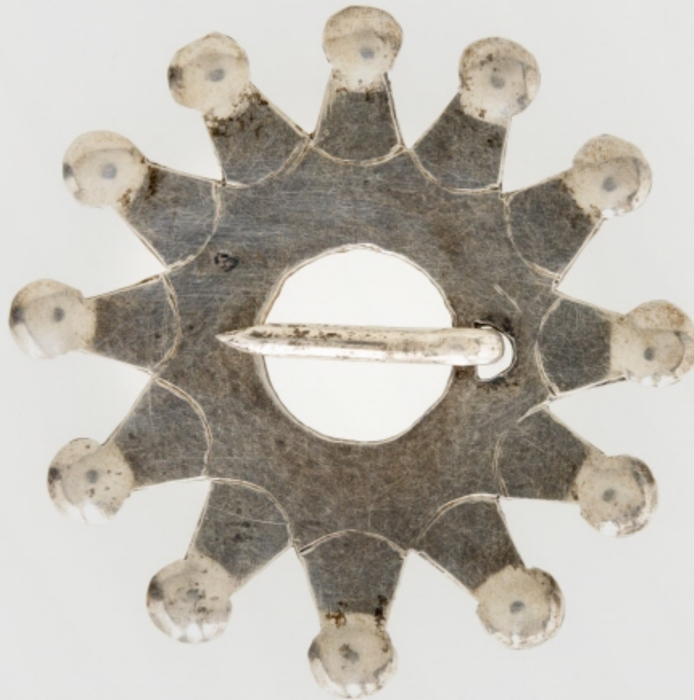
Northeast Woodlands Trade Silver Star Brooch c. 1780 - 1830 (McCord Museum)