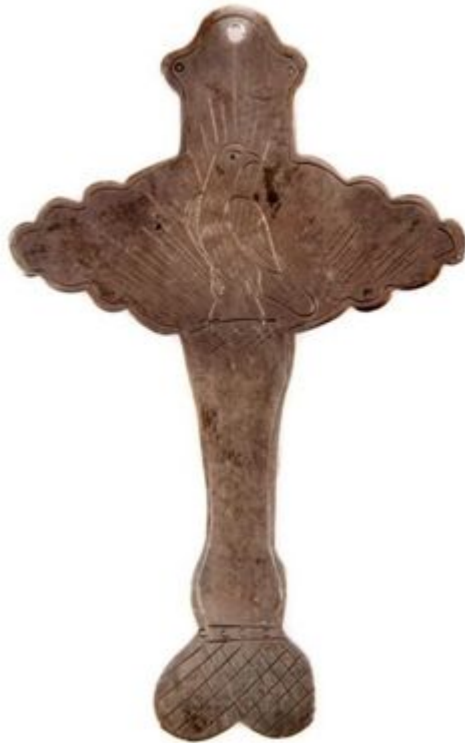
Native American Trade Silver Cross 18th Century (Private Collection)