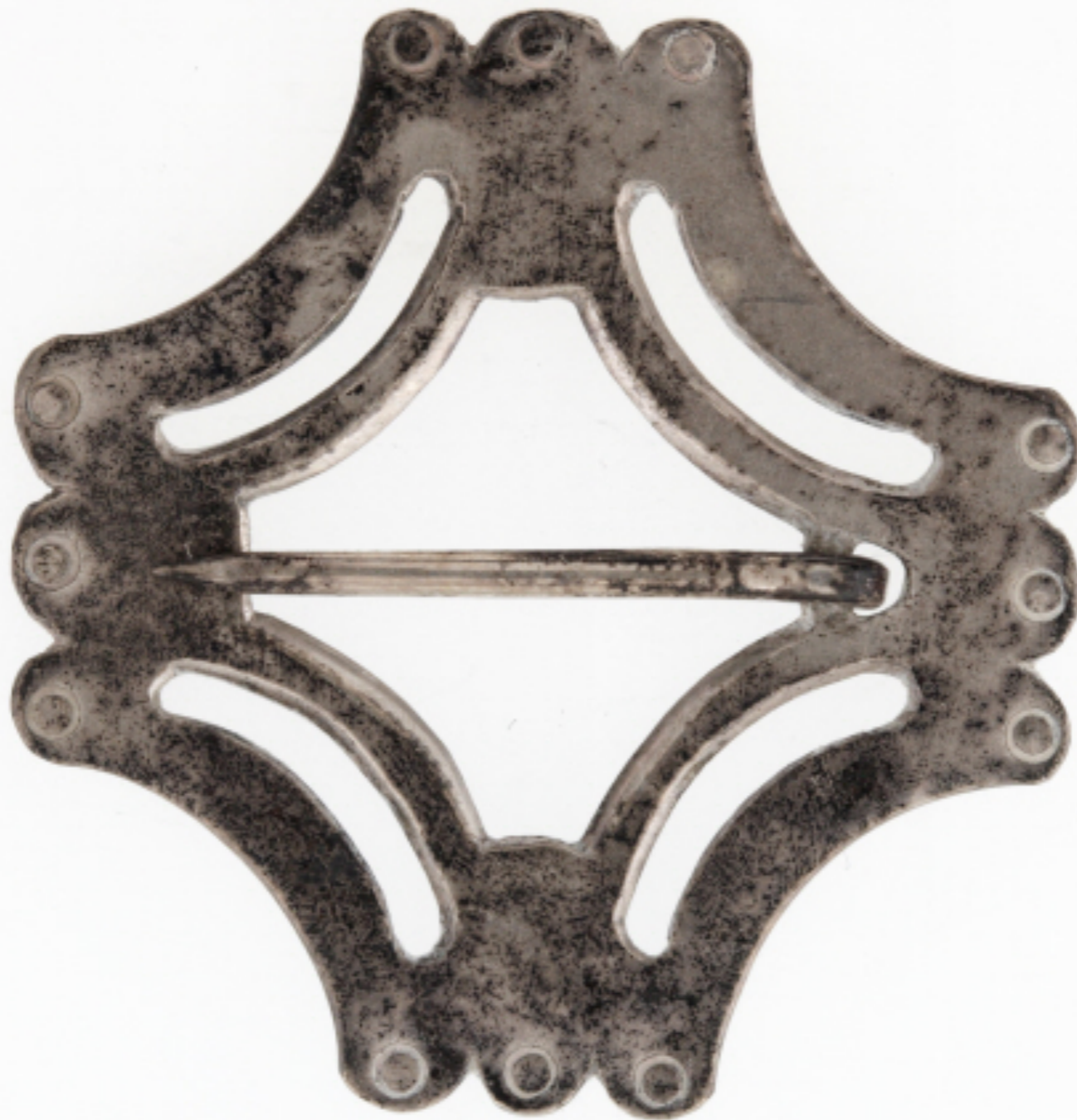
Eastern Woodlands Trade Silver Council Square Brooch c. 1780 - 1830