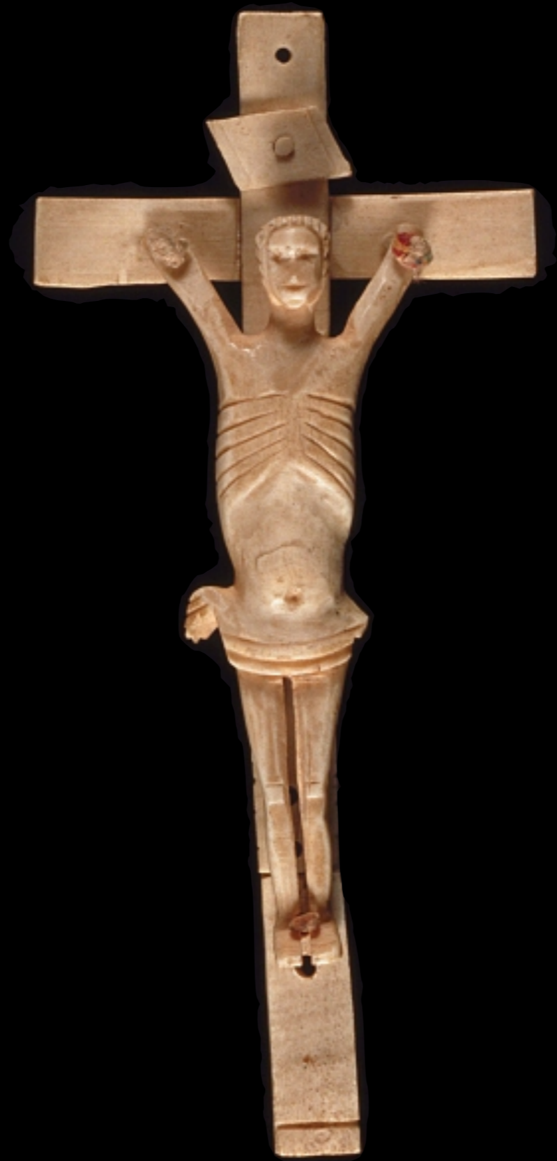
Eastern Woodlands, Maliseet, Crucifix c. 1750 - 1760 (McCord Museum)