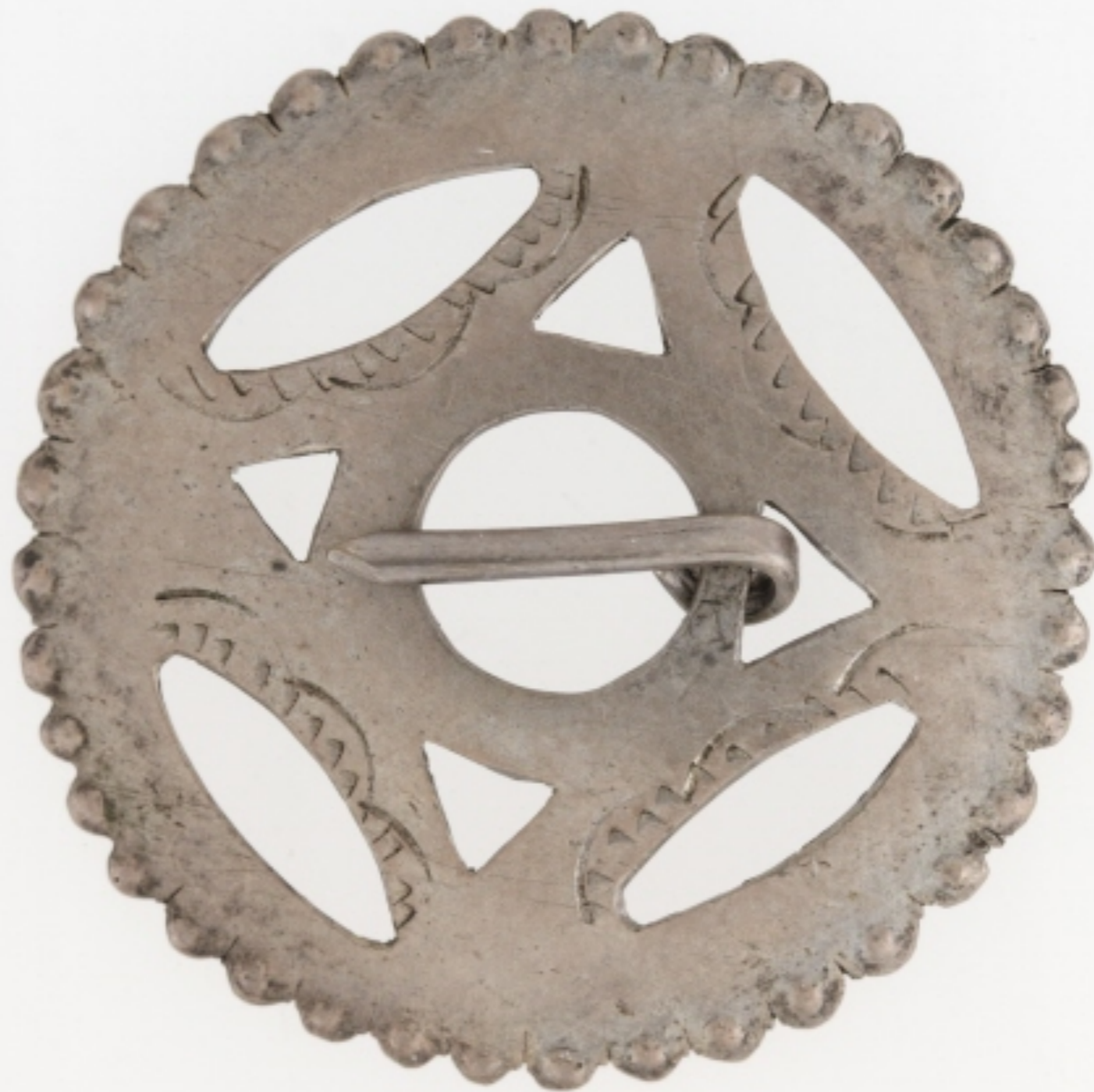
Eastern Woodlands Trade Silver Brooch c. 1780 - 1830