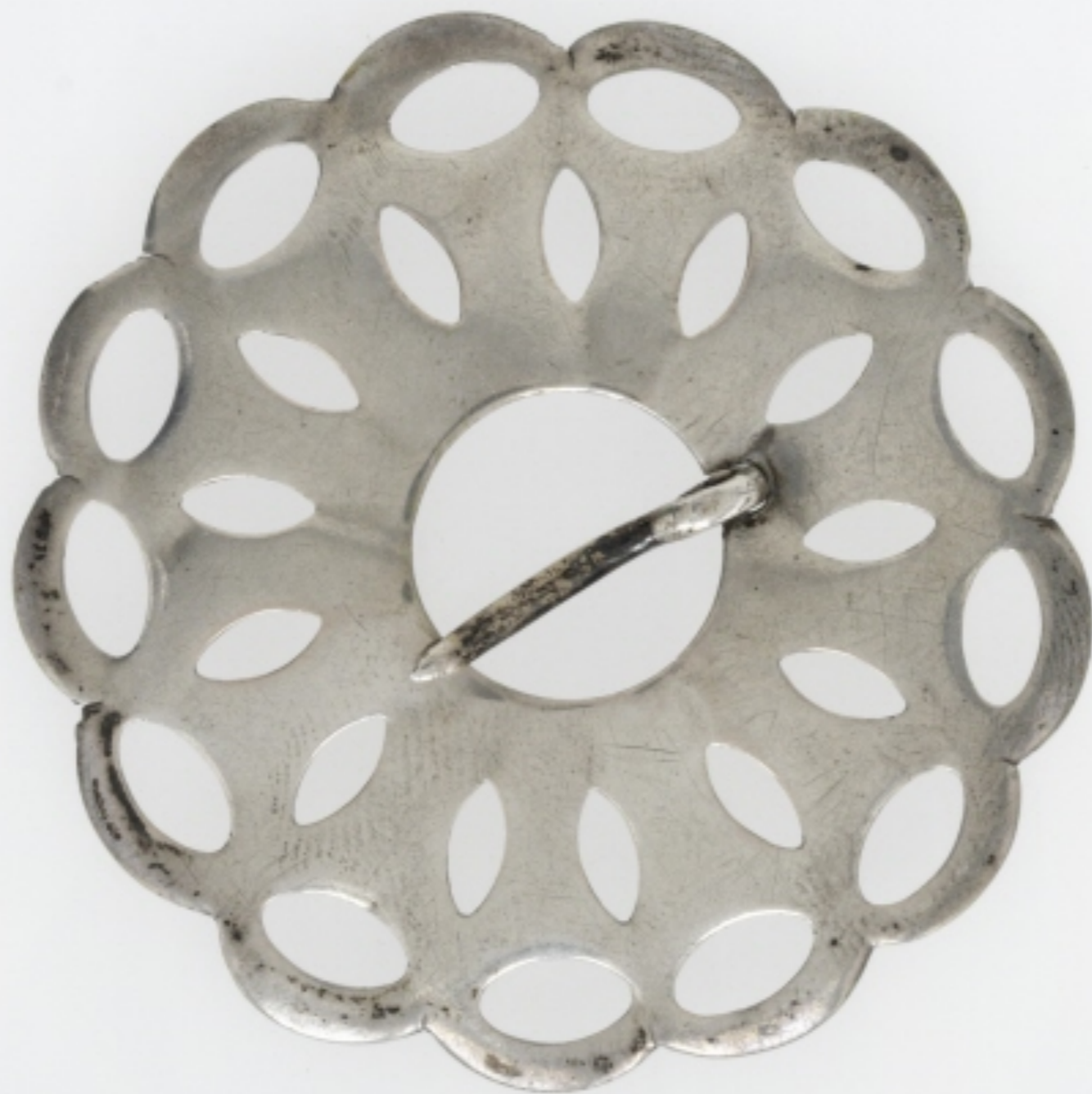
Eastern Woodlands, Iroquois, Trade Silver Brooch c. 1780 - 1830 (McCord Museum)