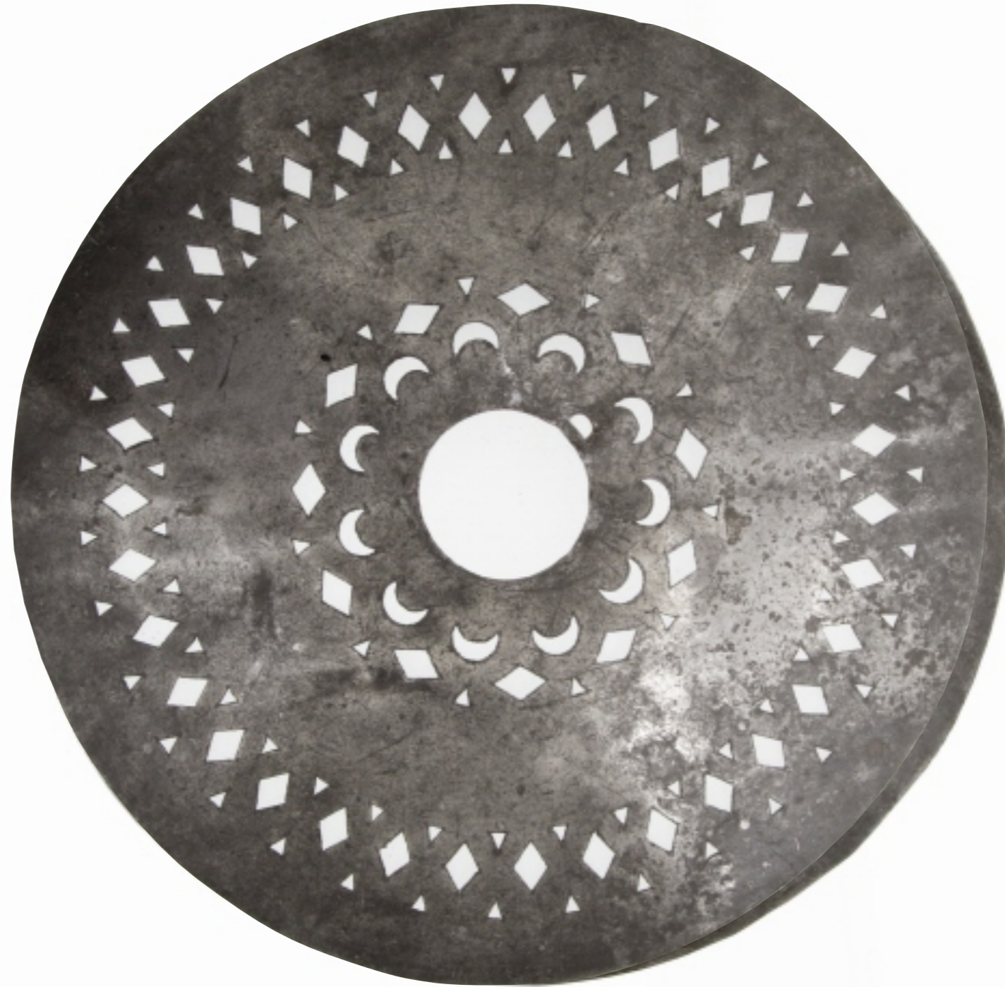
Eastern Woodlands Iroquois Tin Gorget c. 1780 - 1830