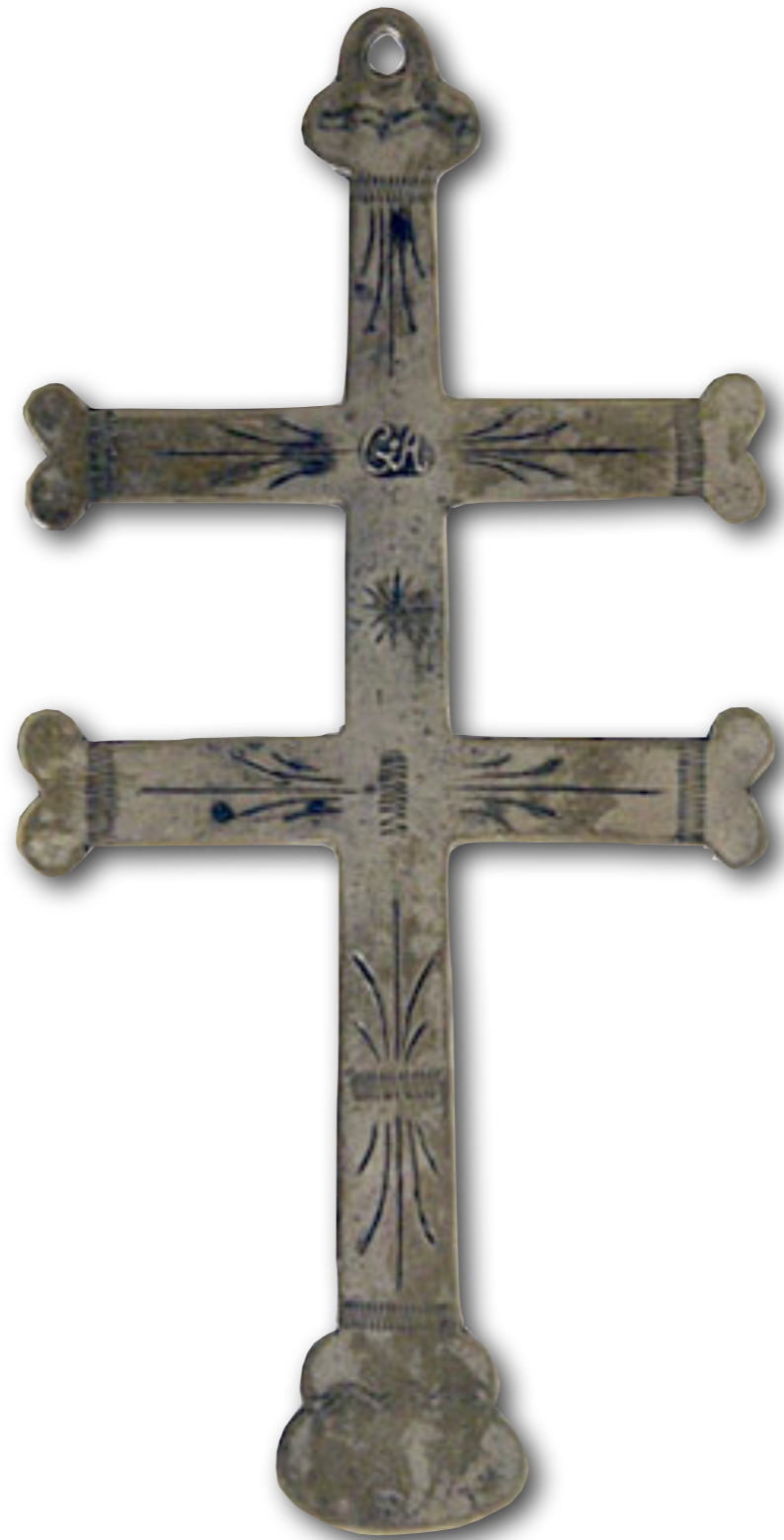
Native American Trade Silver Cross 18th Century (Museum of the Fur Trade)