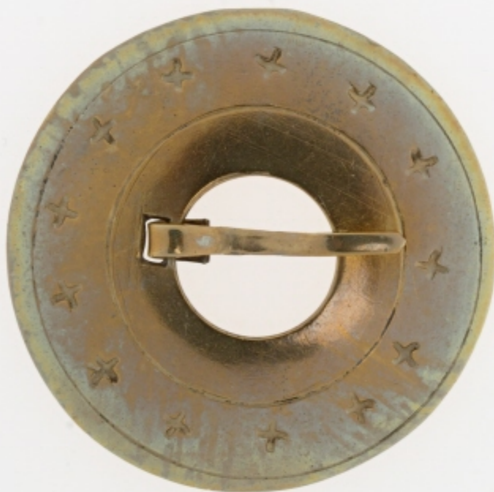
Eastern Woodlands, Iroquois, Trade Silver Brooch c. 1780 - 1830 (McCord Museum)