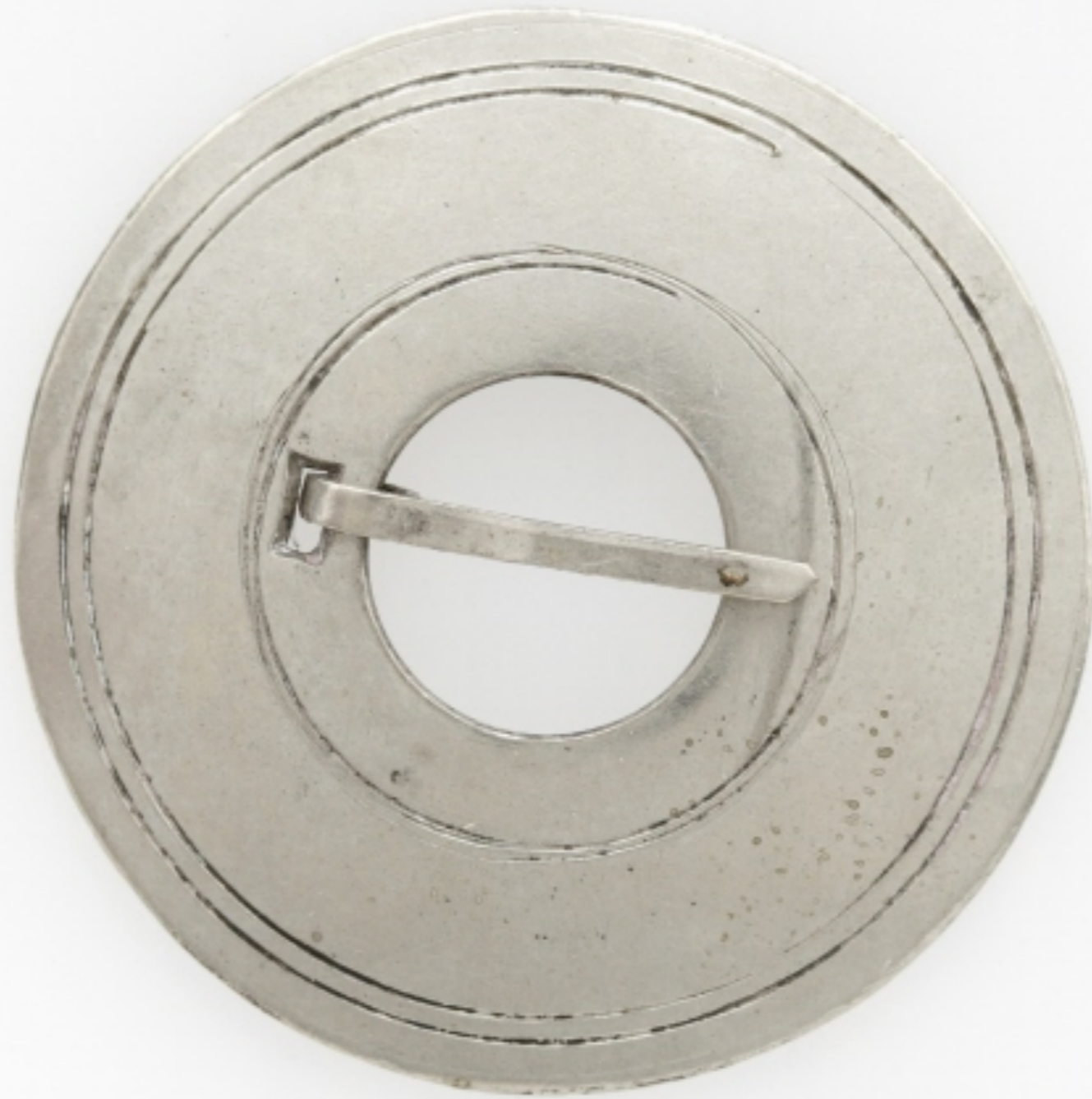
Eastern Woodlands, Iroquois, German Trade Silver Brooch c. 1780 - 1830 (McCord Museum)