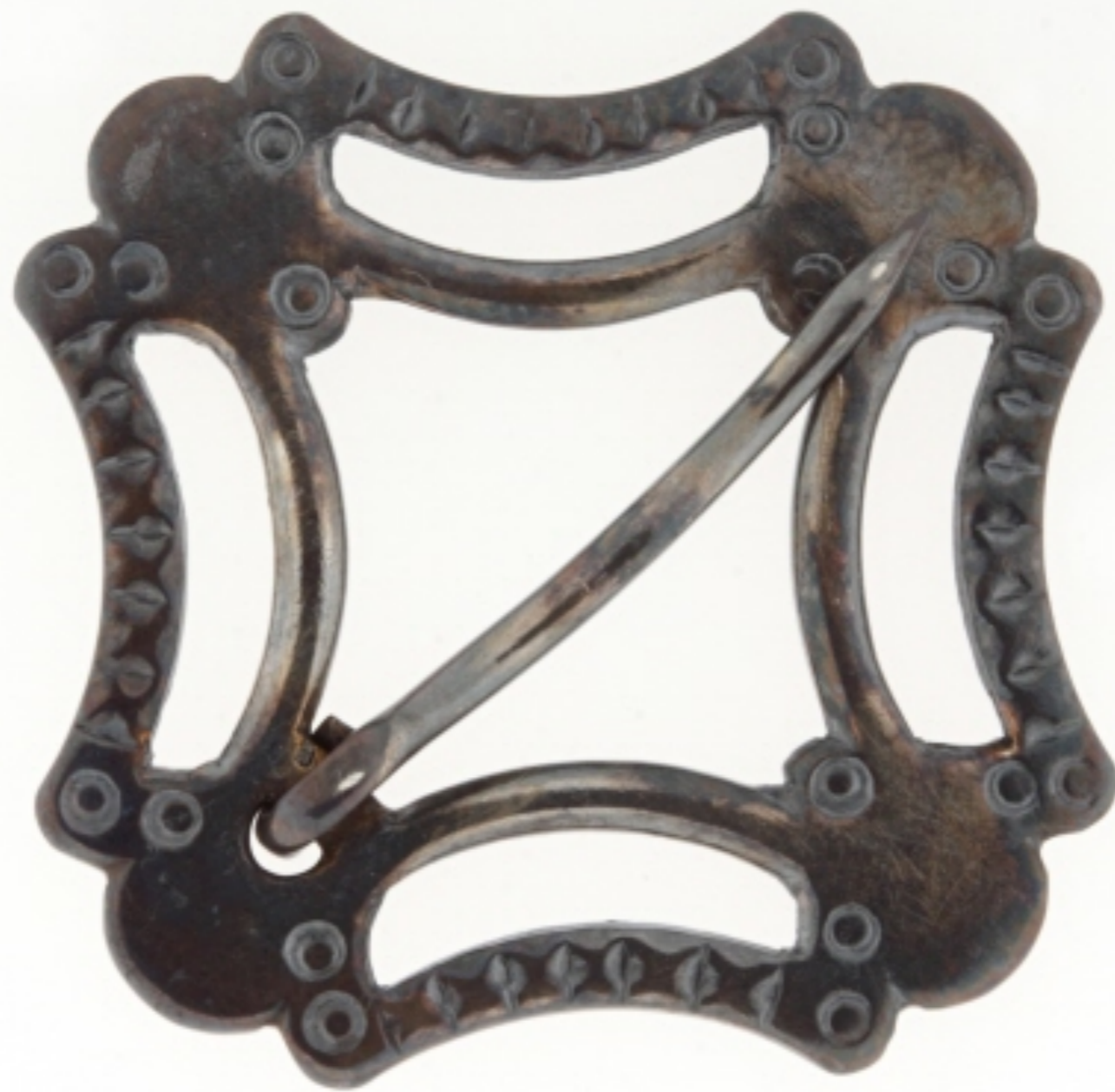
Eastern Woodlands, Iroquois, Trade Silver Council Square Brooch c. 1780 - 1830 (McCord Museum)