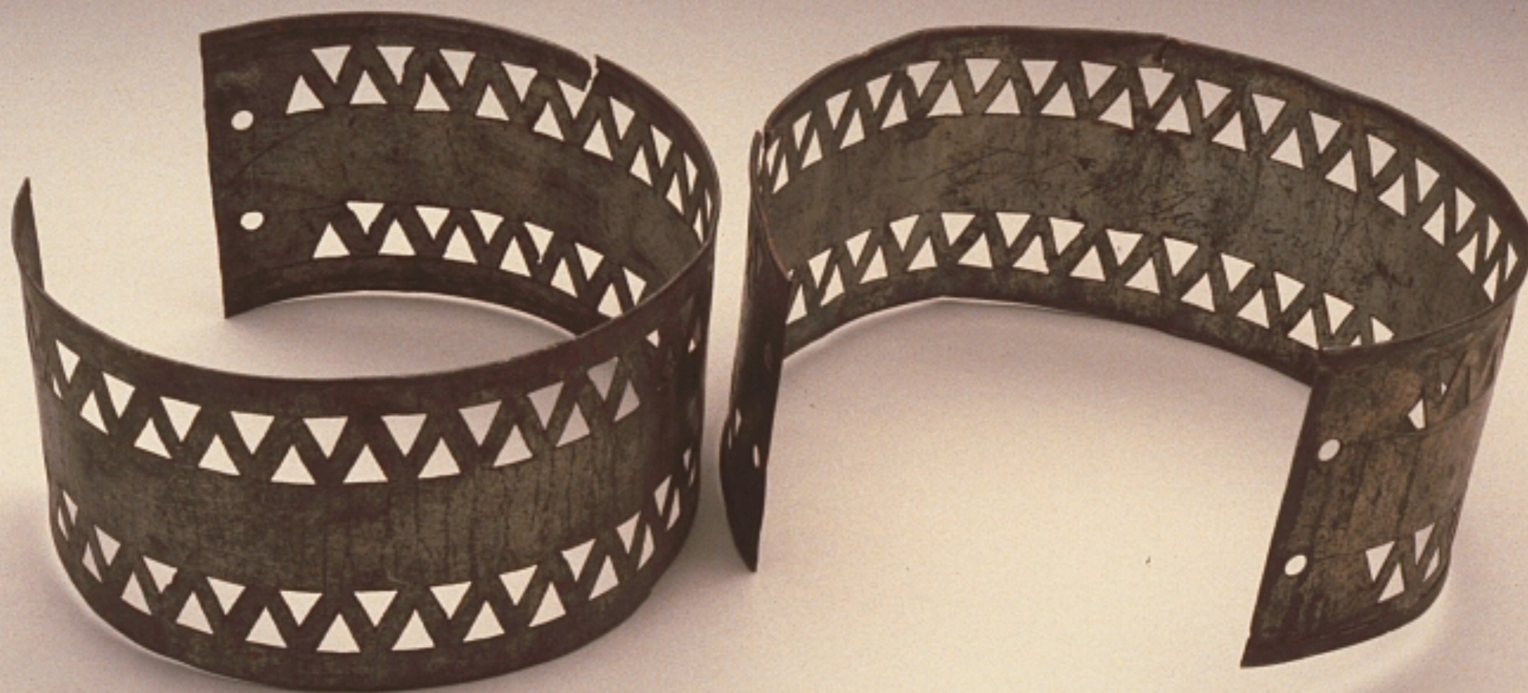
Eastern Woodlands, Iroquois or Mohawk, Tin Armbands c. 1780 - 1830 (McCord Museum)