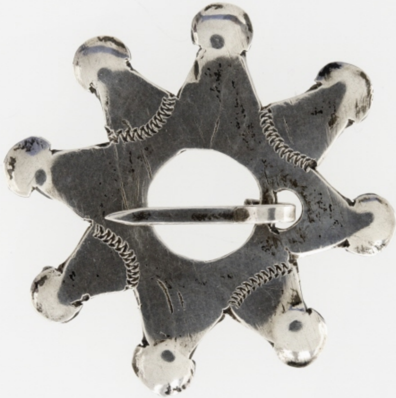
Northeast Woodlands Trade Silver Star Brooch c. 1780 - 1830 (McCord Museum)