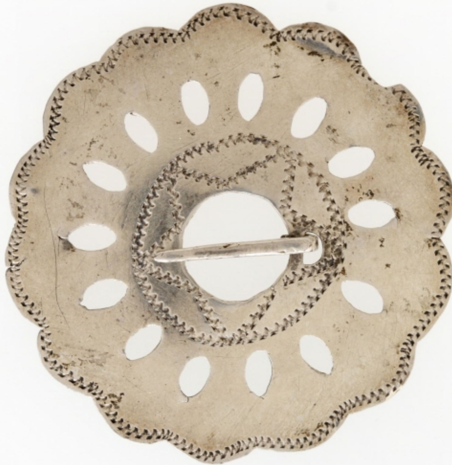
Eastern Woodlands Trade Silver Brooch c. 1780 - 1830 (McCord Museum)