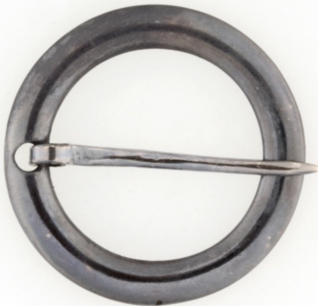
Eastern Woodlands Trade Silver Brooch c. 1780 - 1830 (McCord Museum)