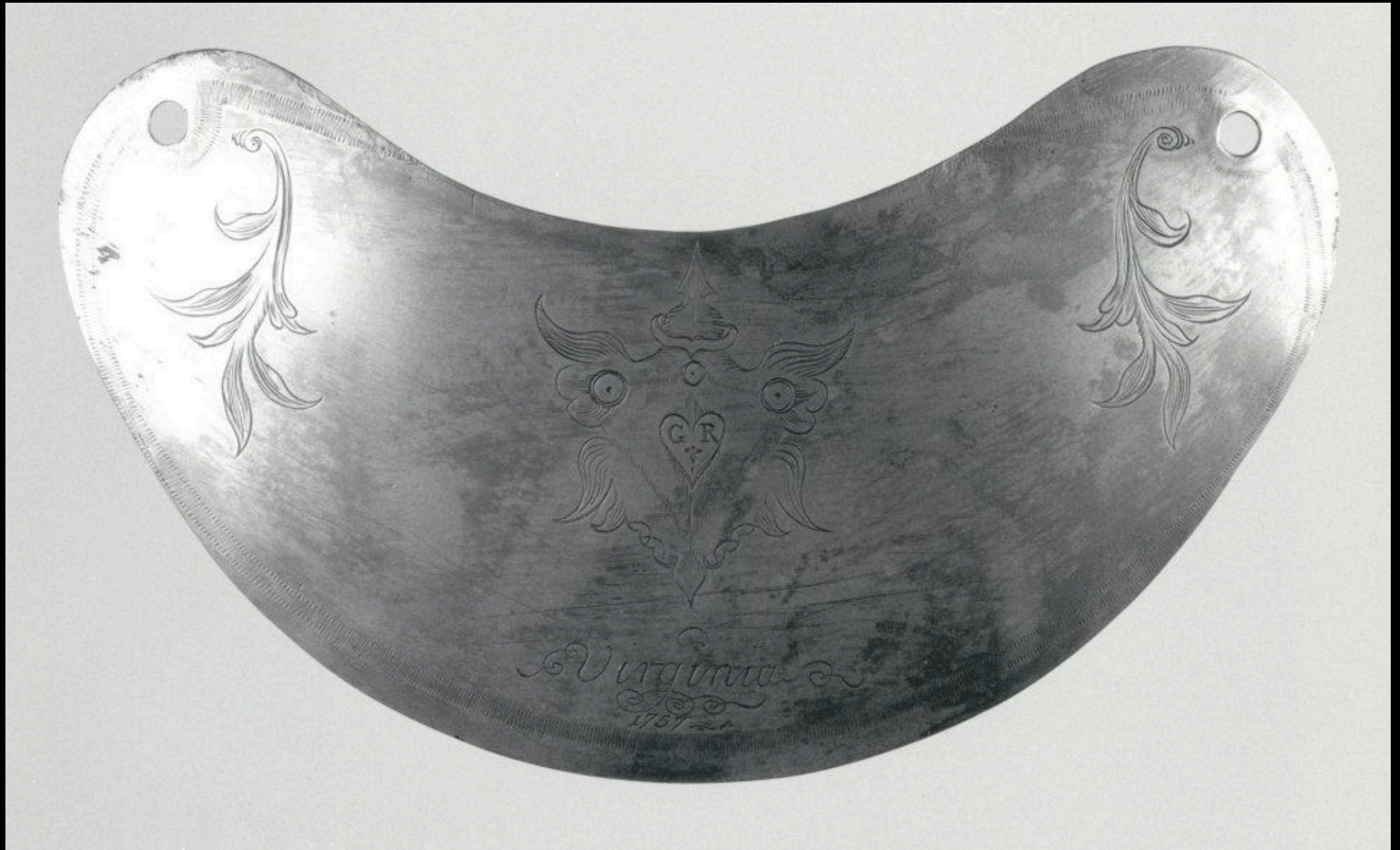
Native American Trade Silver Gorget from Overhill Cherokee Engraved "Virginia 1757" Possibly Produced in Williamsburg (McClung Museum)