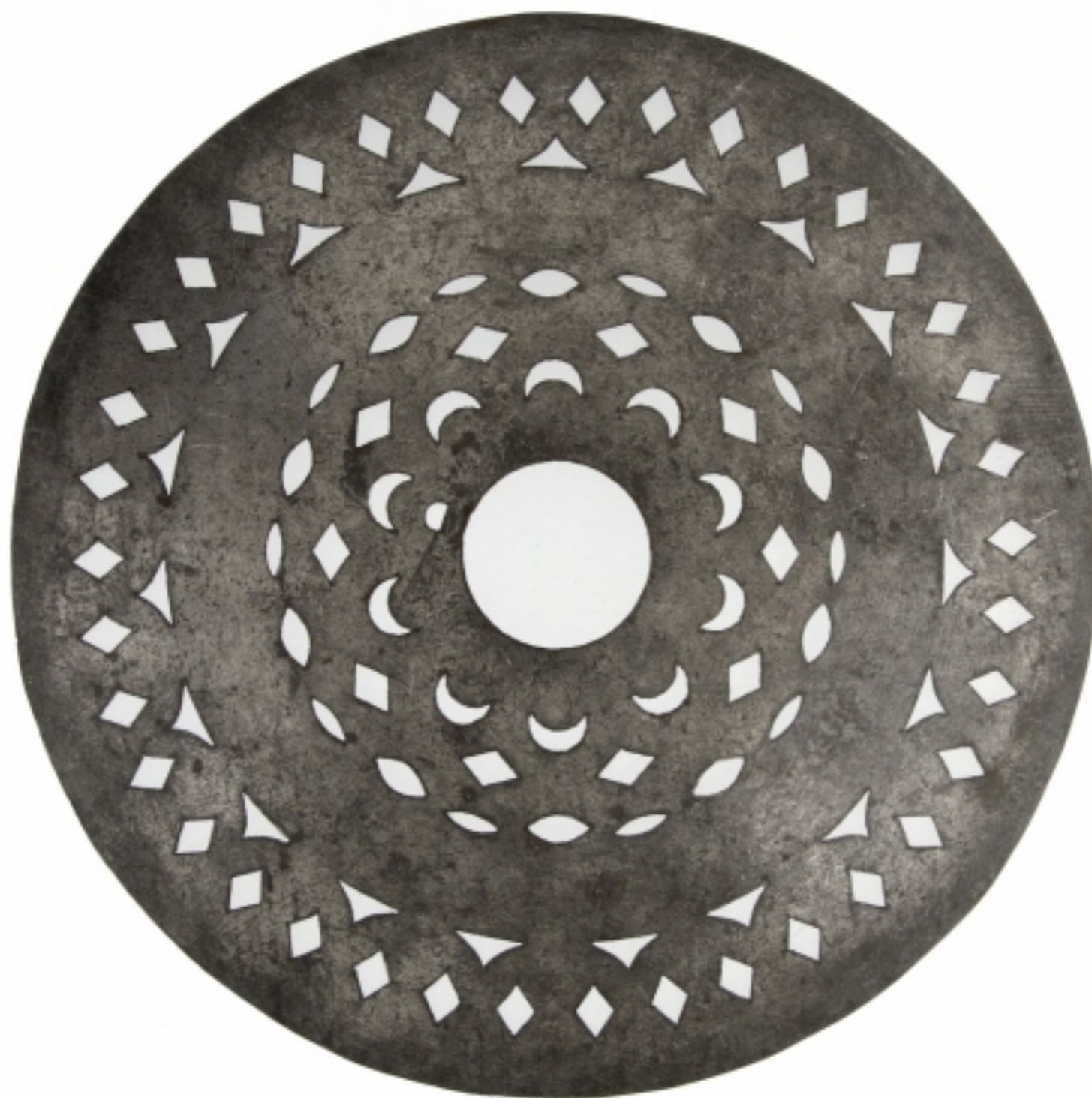
Eastern Woodlands Iroquois Tin Gorget c. 1780 - 1830 (McCord Museum)