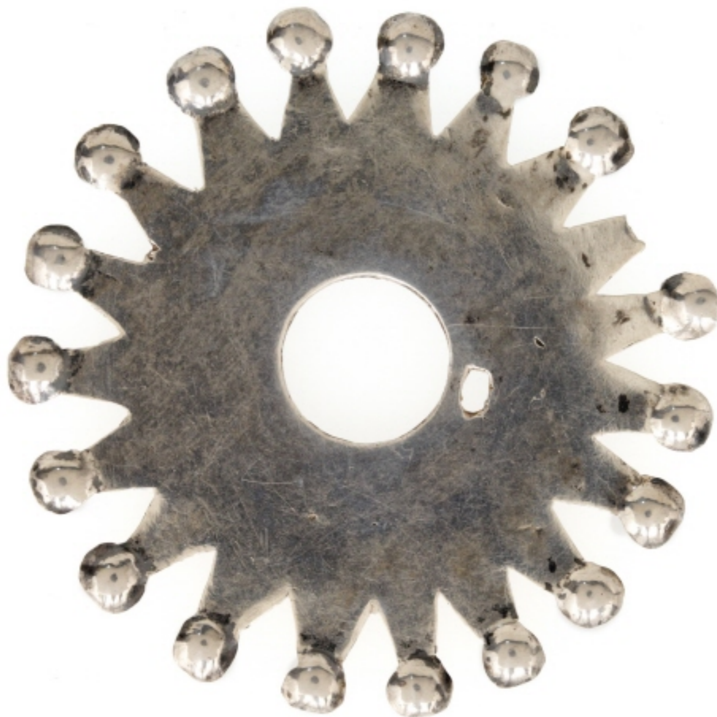
Northeast Woodlands Trade Silver Star Brooch c. 1780 - 1830 (McCord Museum)