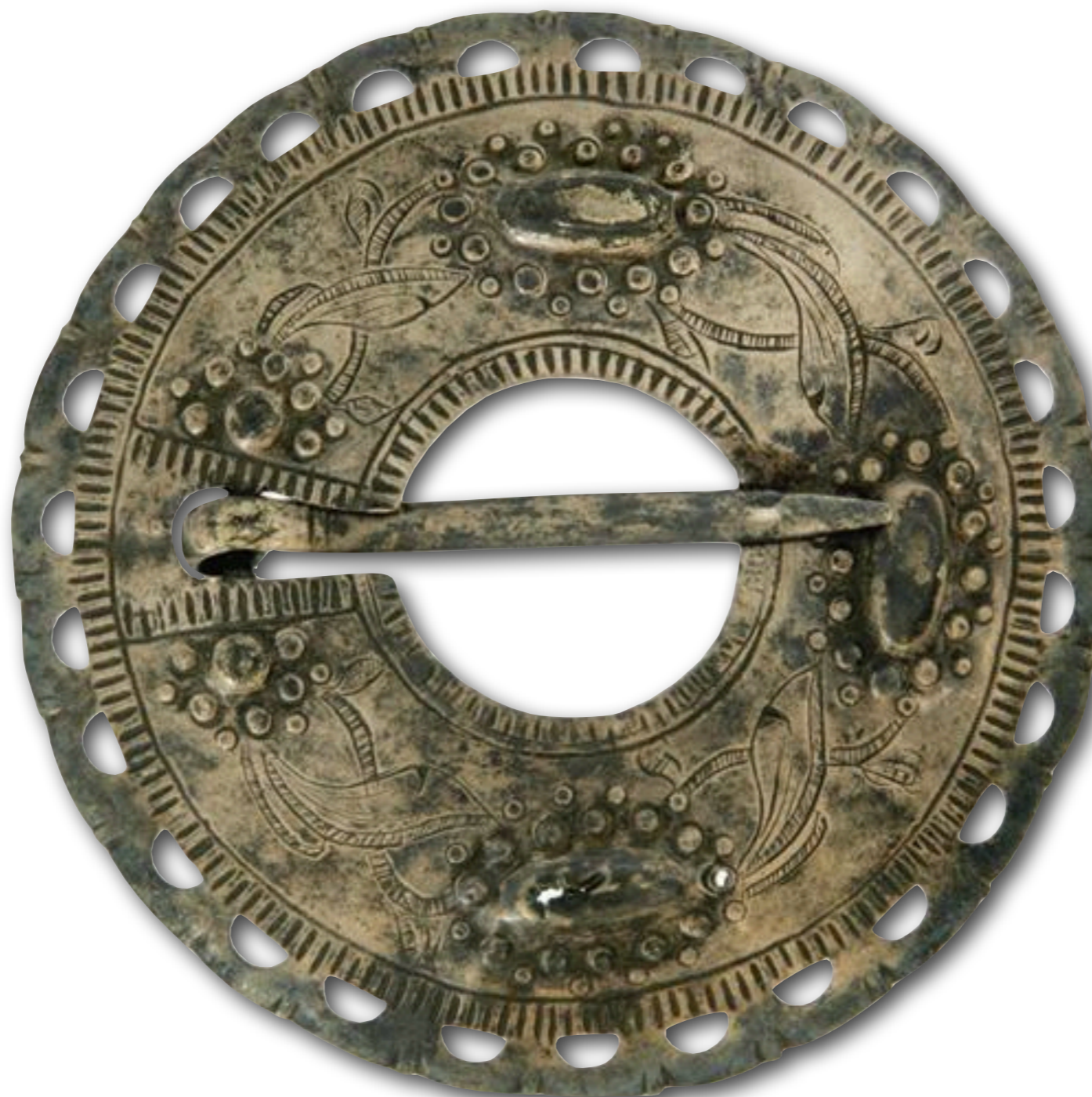
Native American Trade Silver Brooch