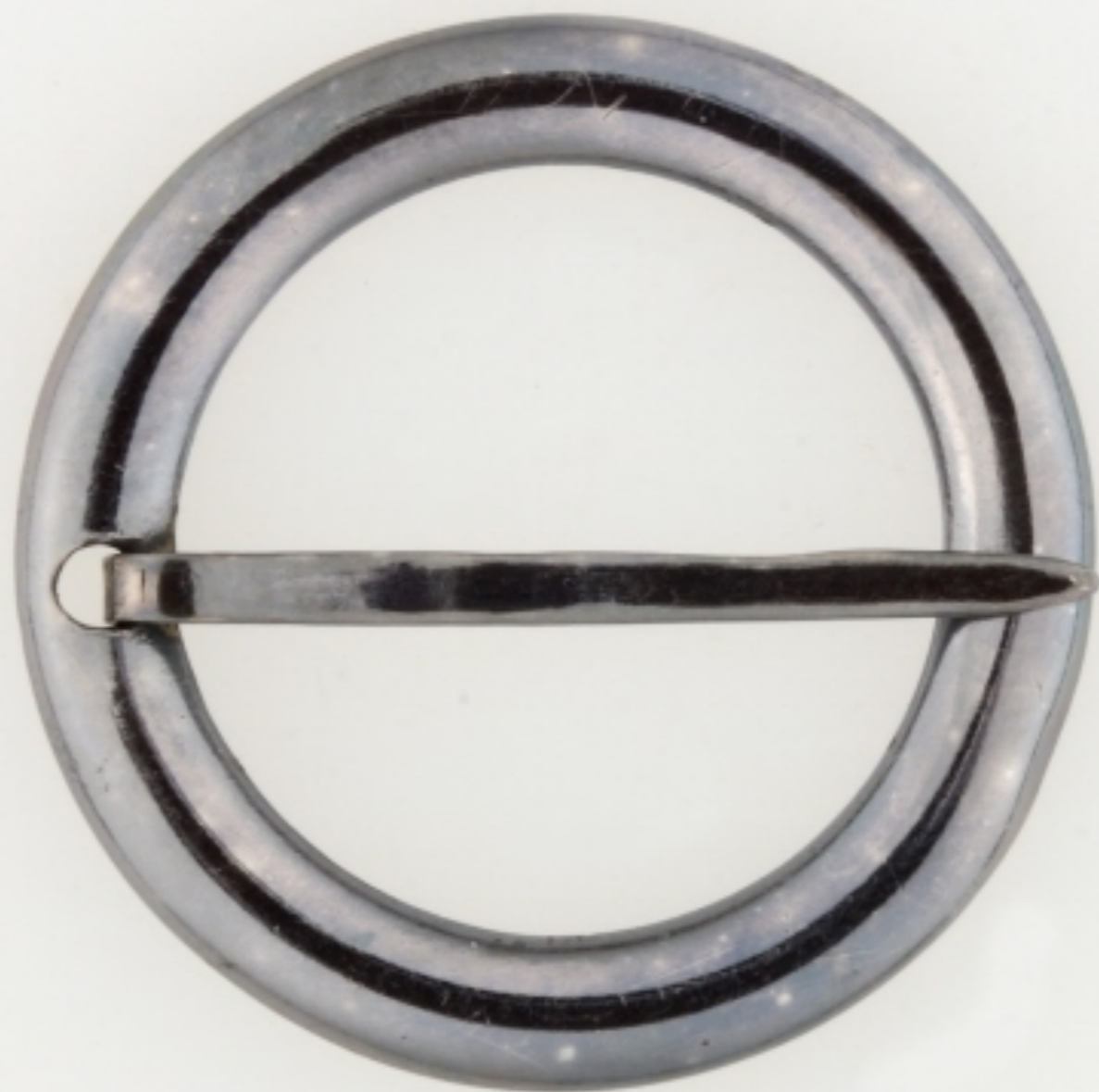
Eastern Woodlands Trade Silver Brooch c. 1780 - 1830 (McCord Museum)