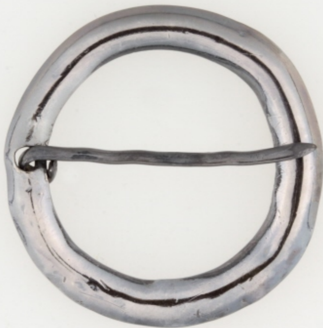
Eastern Woodlands Trade Silver Brooch c. 1780 - 1830 (McCord Museum)