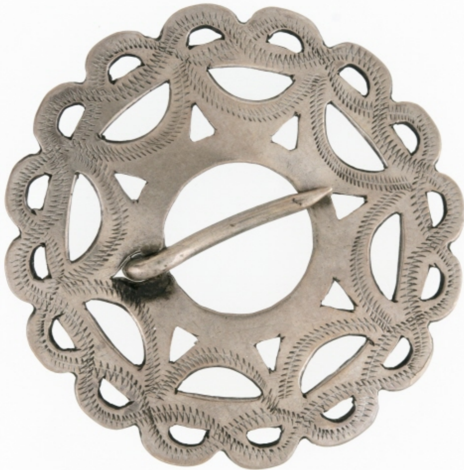
Eastern Woodlands Trade Silver Brooch c. 1780 - 1830