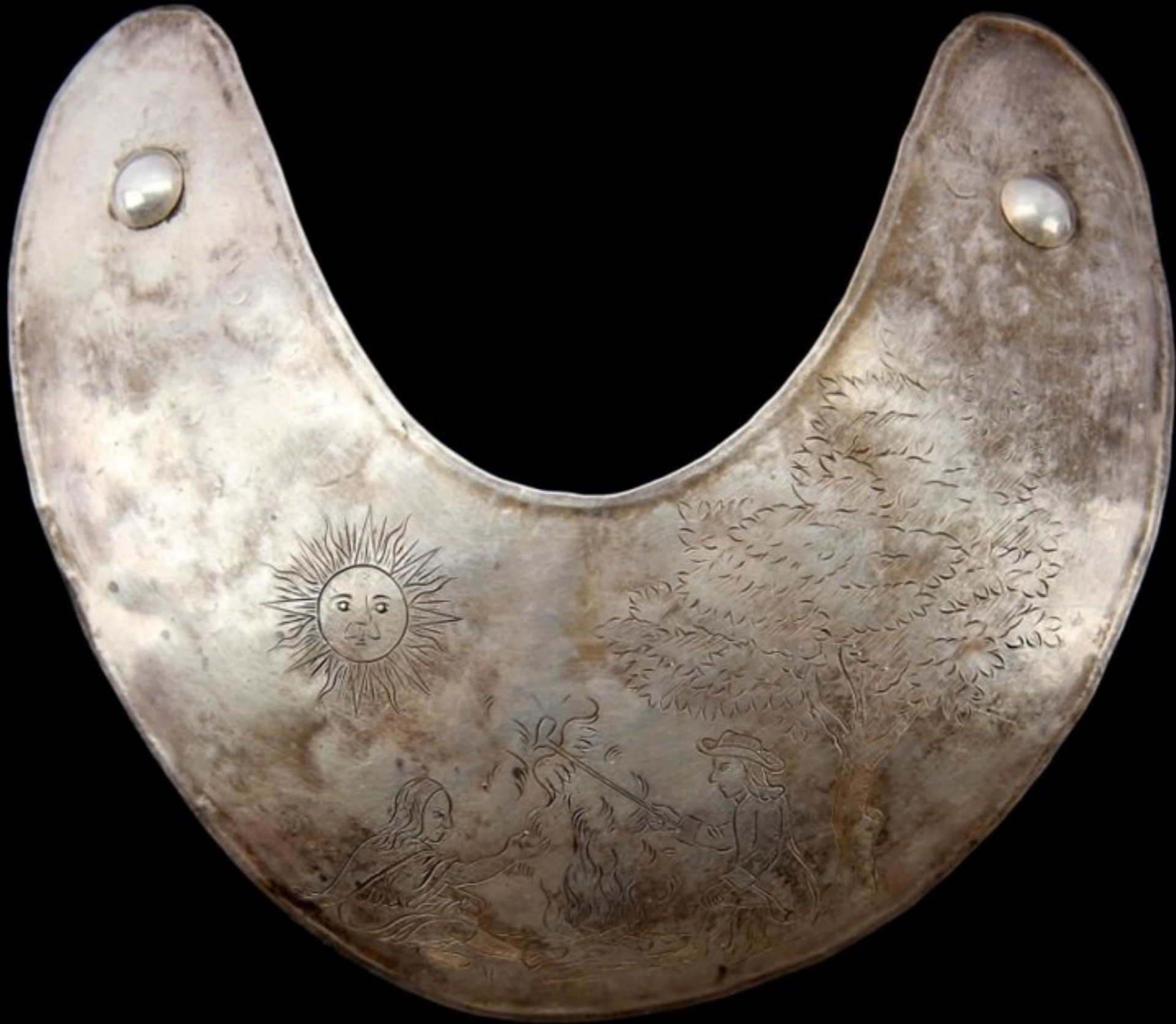
Native American Trade Silver Gorget 18th Century (Affiliated Auctions)