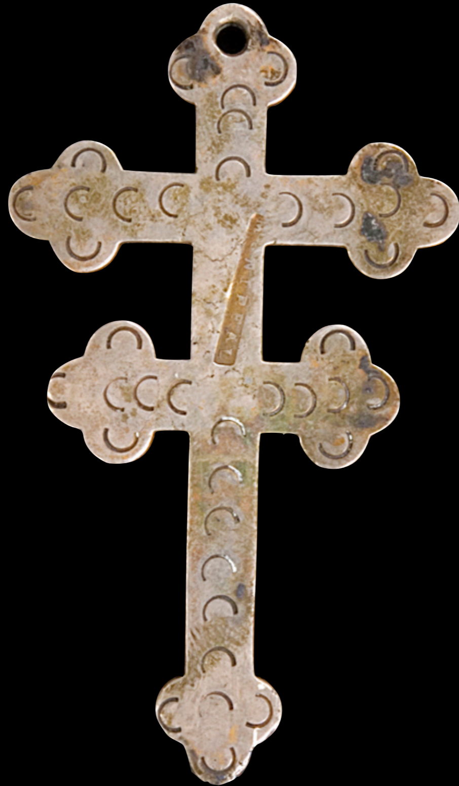
Native American Trade Silver Cross Late 18th Century (Clements Library)