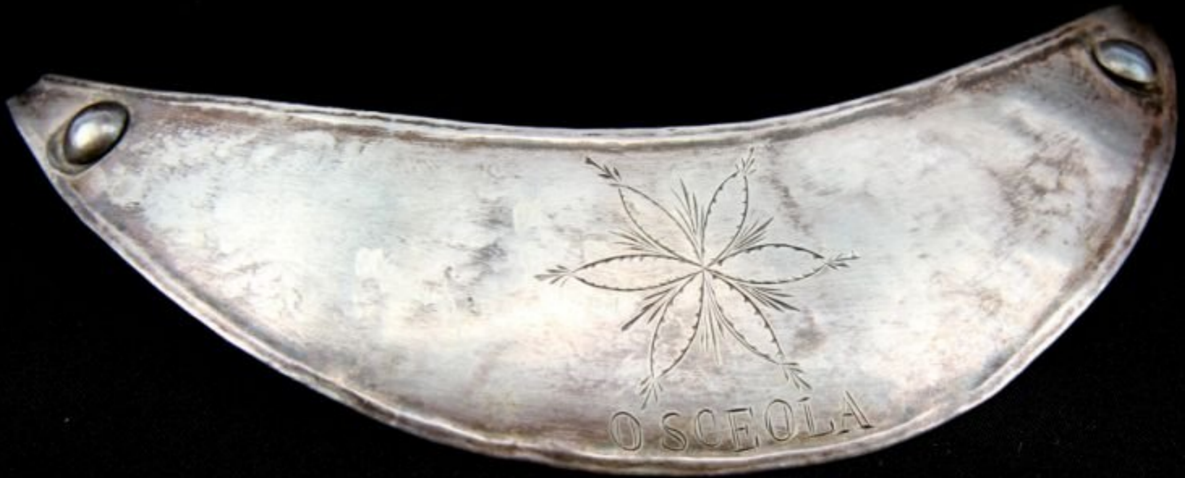
Native American "OSCEOLA" Trade Silver Gorget 18th Century (Affiliated Auctions)