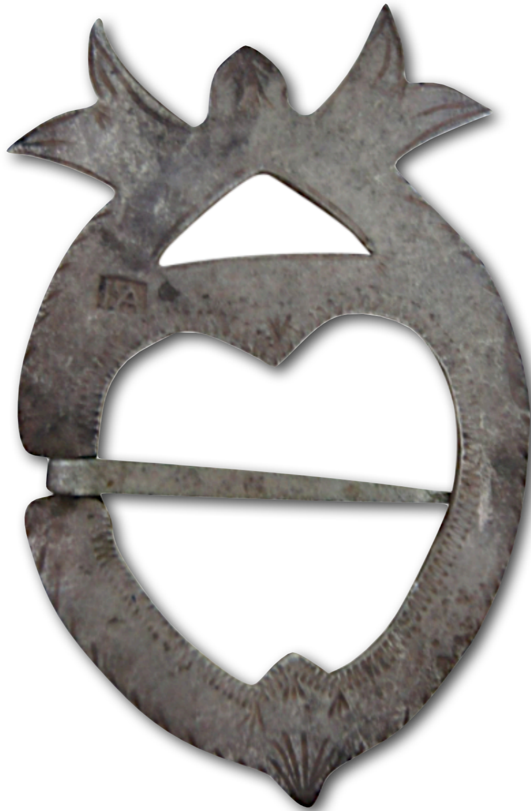
Iroquois Trade Silver Brooch Hallmarked "IA" c. 1750 - 1830