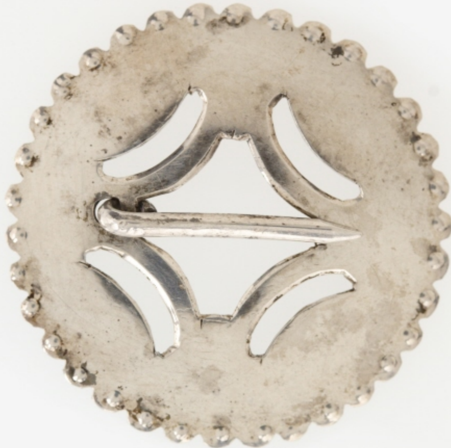
Eastern Woodlands Trade Silver Brooch c. 1780 - 1830 (McCord Museum)