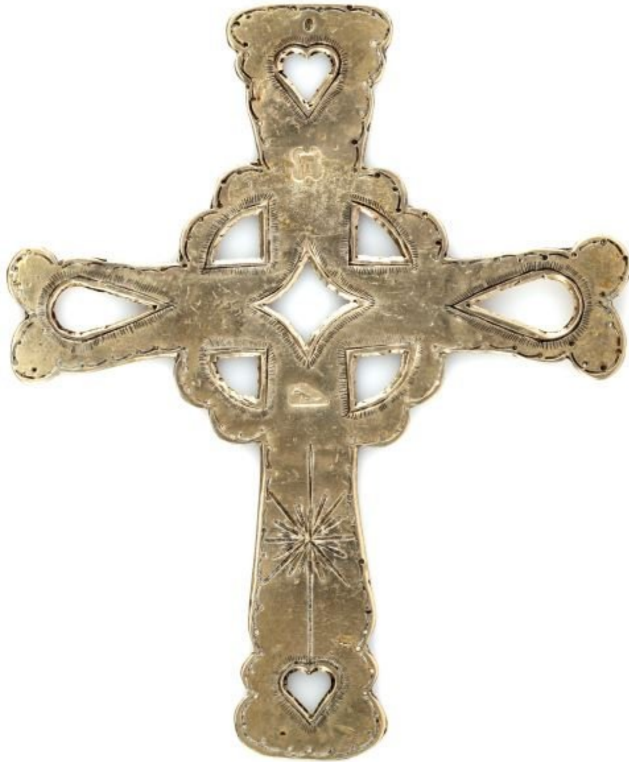
French Trade Silver Cross 18th Century (Affiliated Auctions)