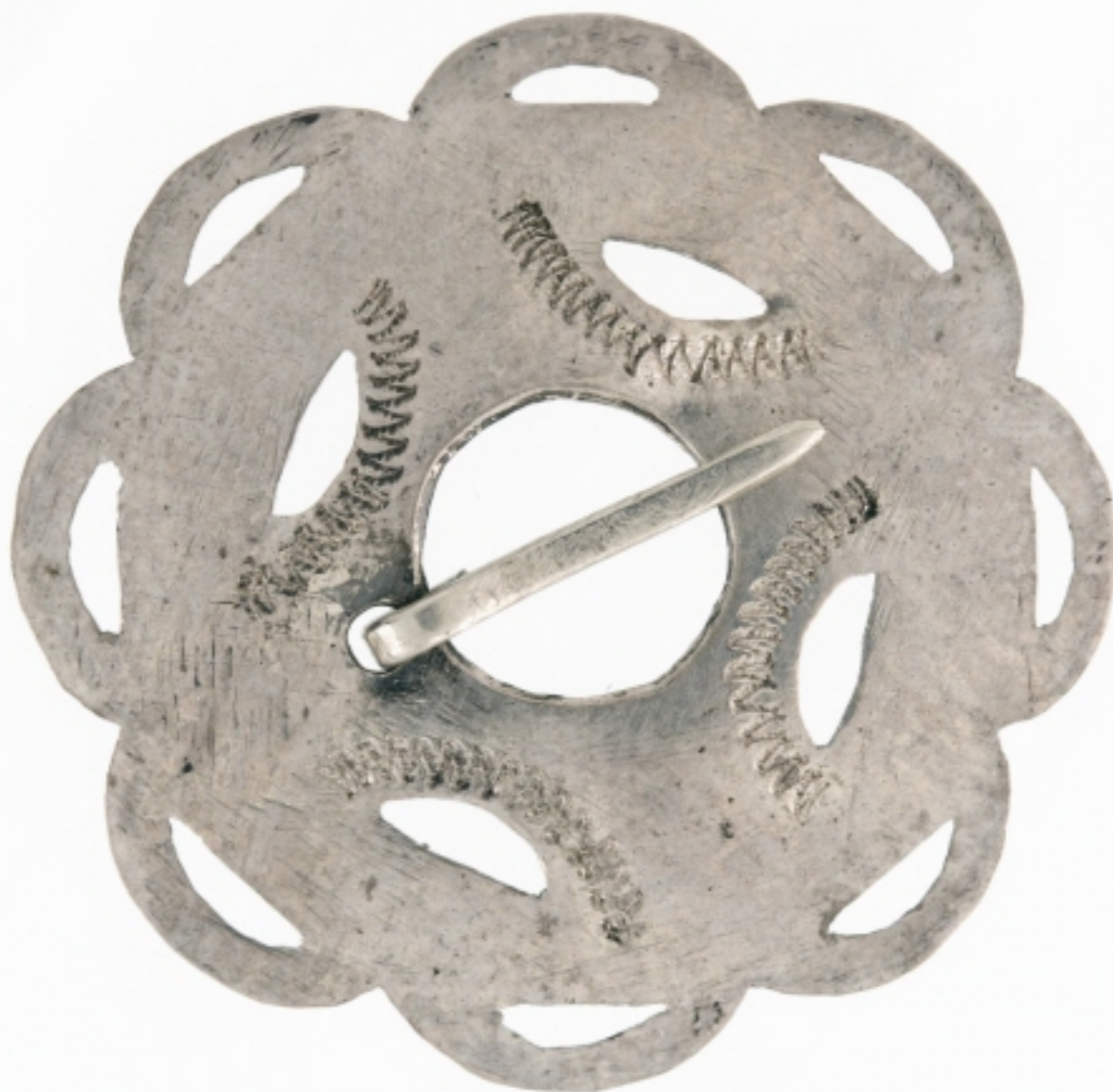
Eastern Woodlands Trade Silver Brooch c. 1780 - 1830 (McCord Museum)