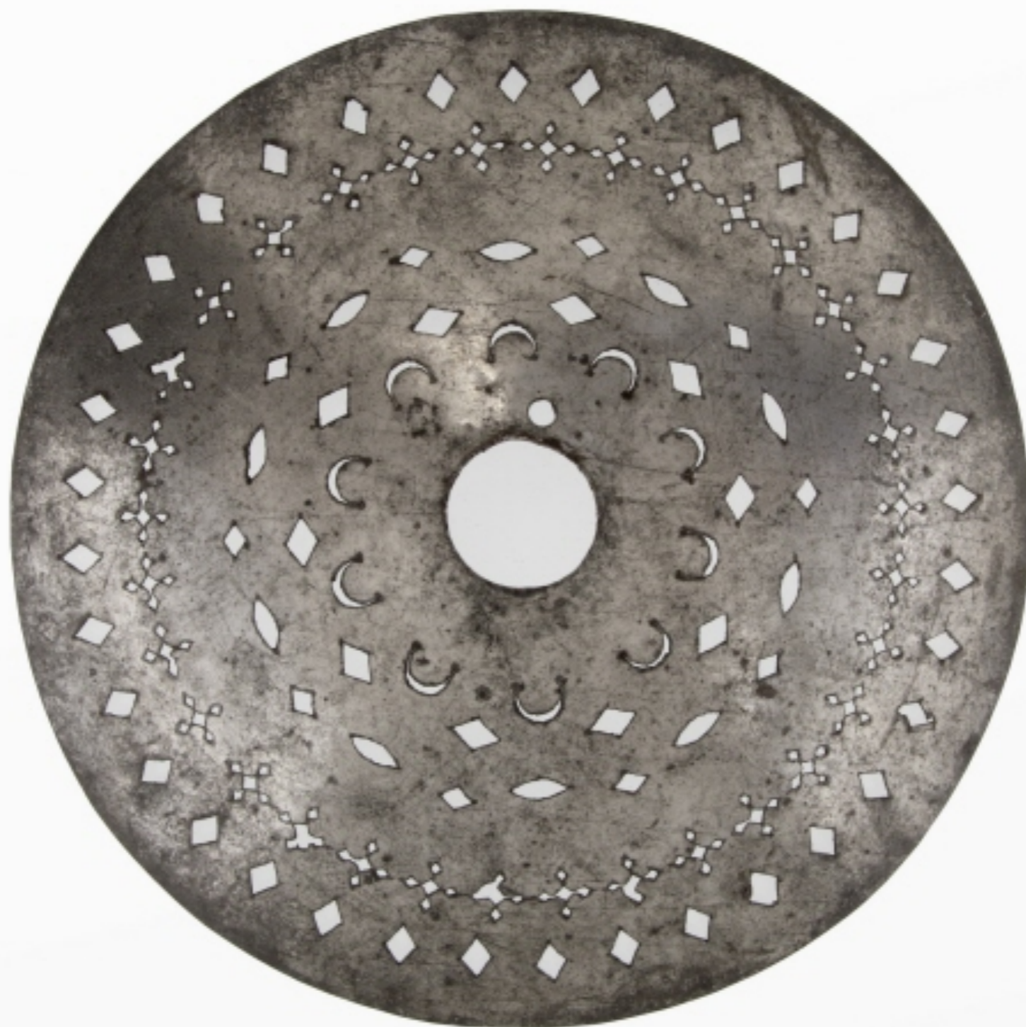
Eastern Woodlands Iroquois Tin Gorget c. 1780 - 1830 (McCord Museum)