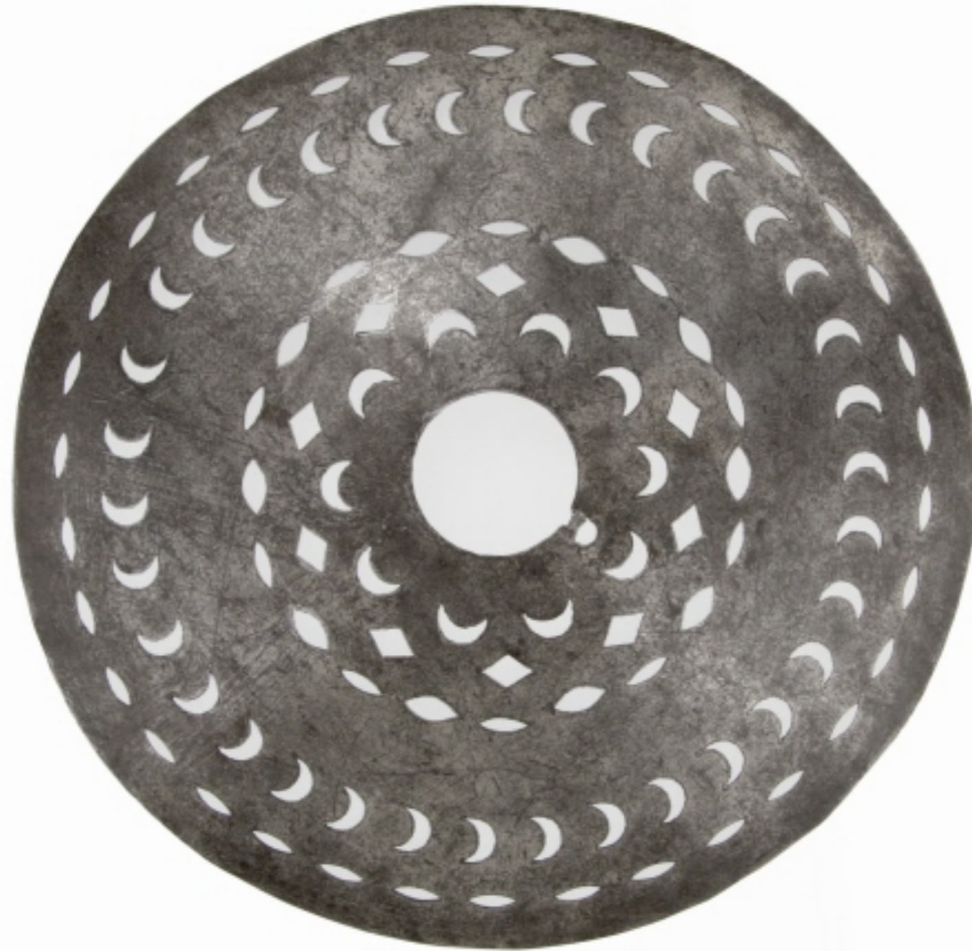
Eastern Woodlands Iroquois Tin Gorget c. 1780 - 1830