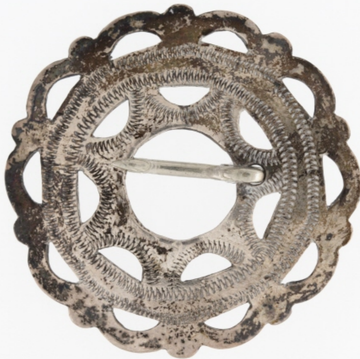
Eastern Woodlands Trade Silver Brooch c. 1780 - 1830 (McCord Museum)