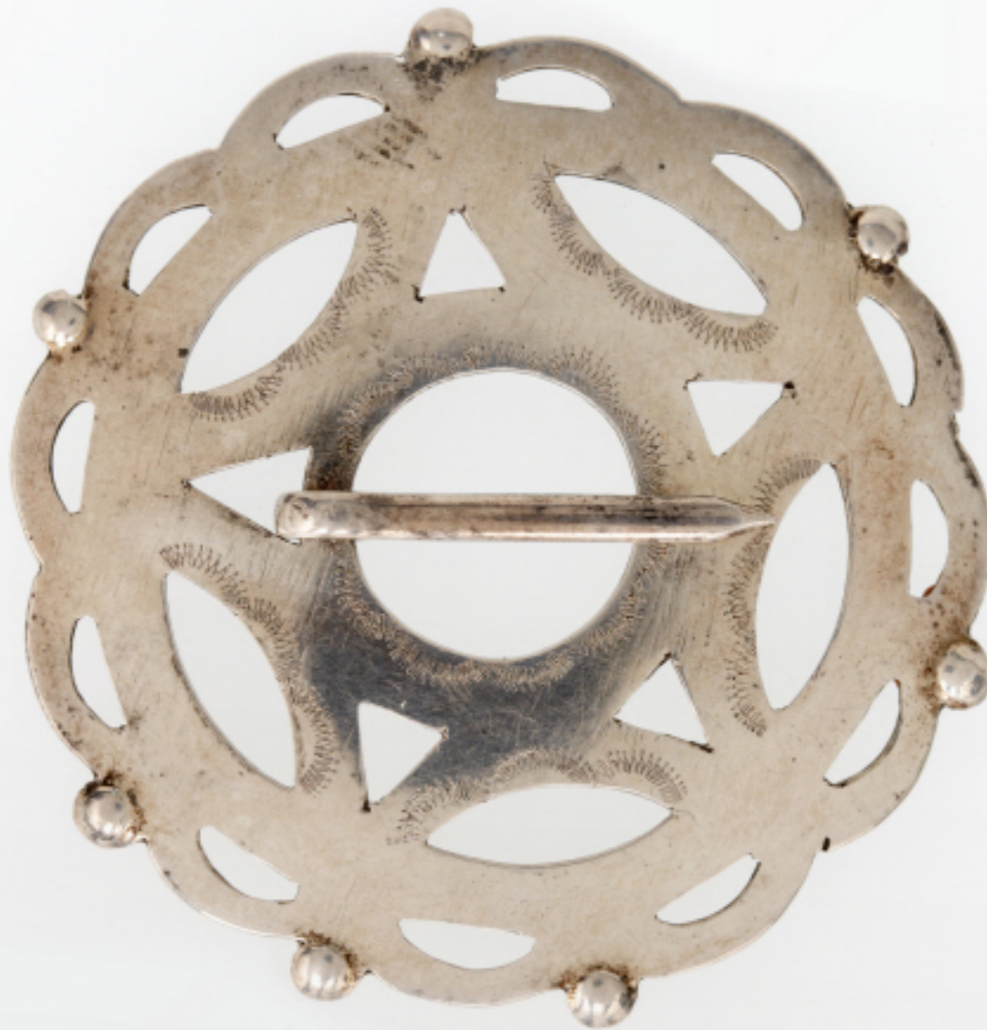
Eastern Woodlands Trade Silver Brooch c. 1780 - 1830 (McCord Museum)