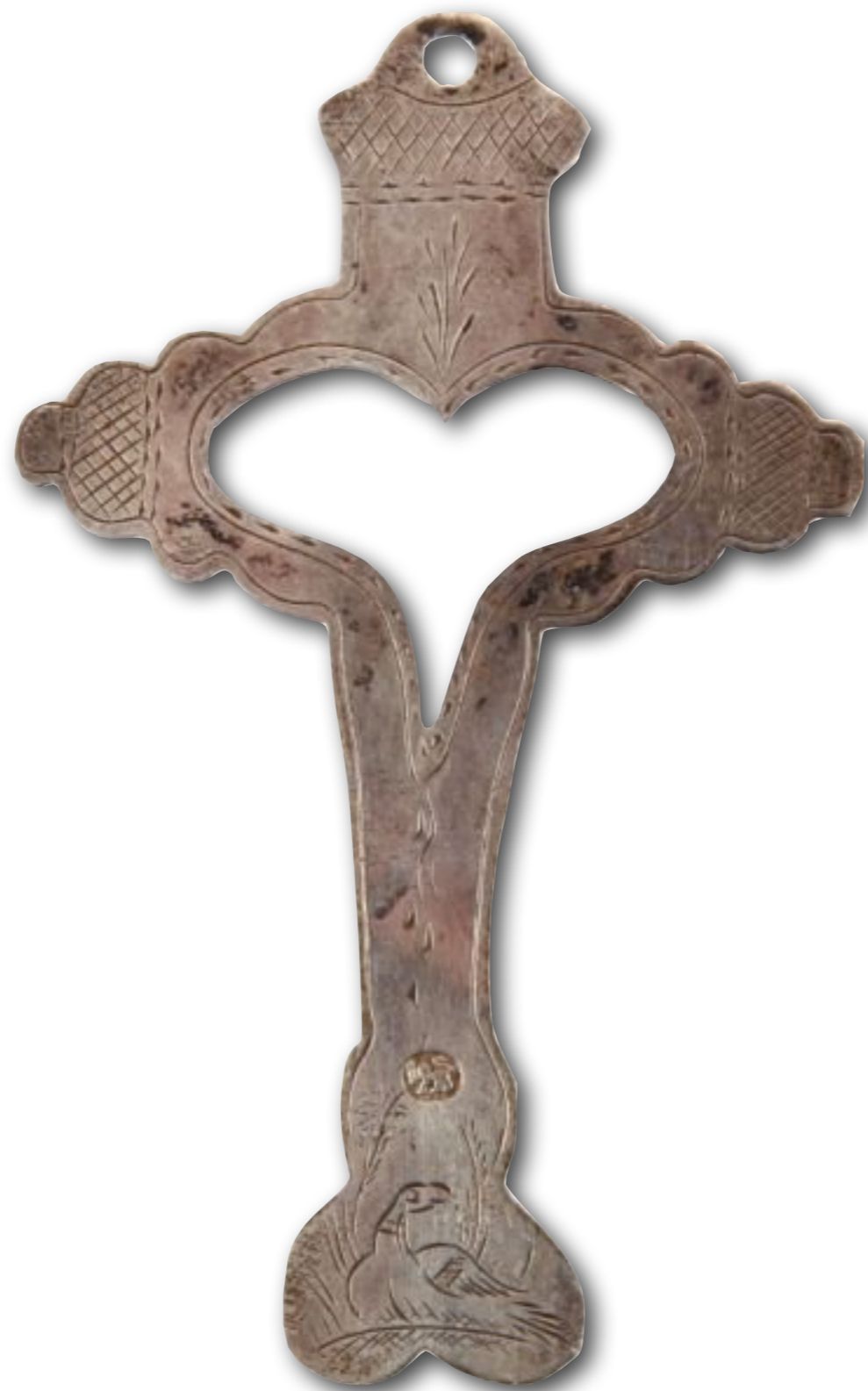
French Trade Silver Cross 18th Century (Affiliated Auctions)