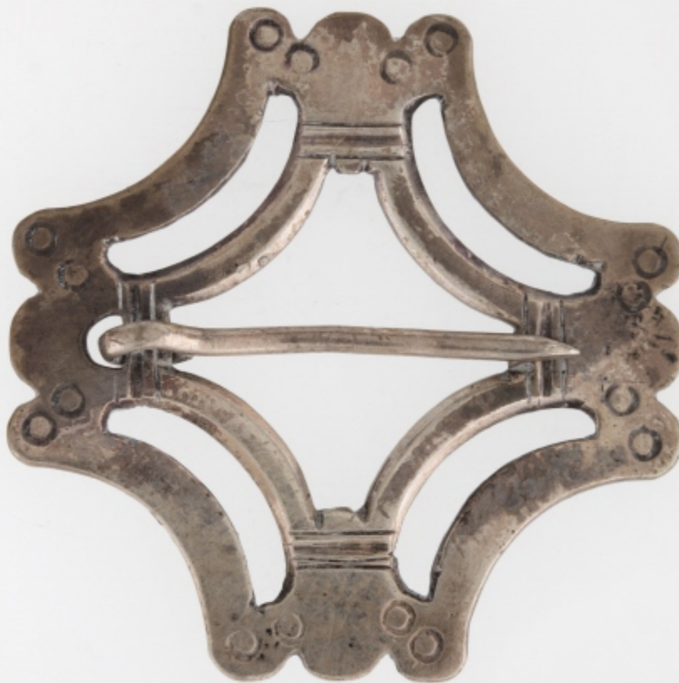
Eastern Woodlands Trade Silver Council Square Brooch c. 1780 - 1830 (McCord Museum)