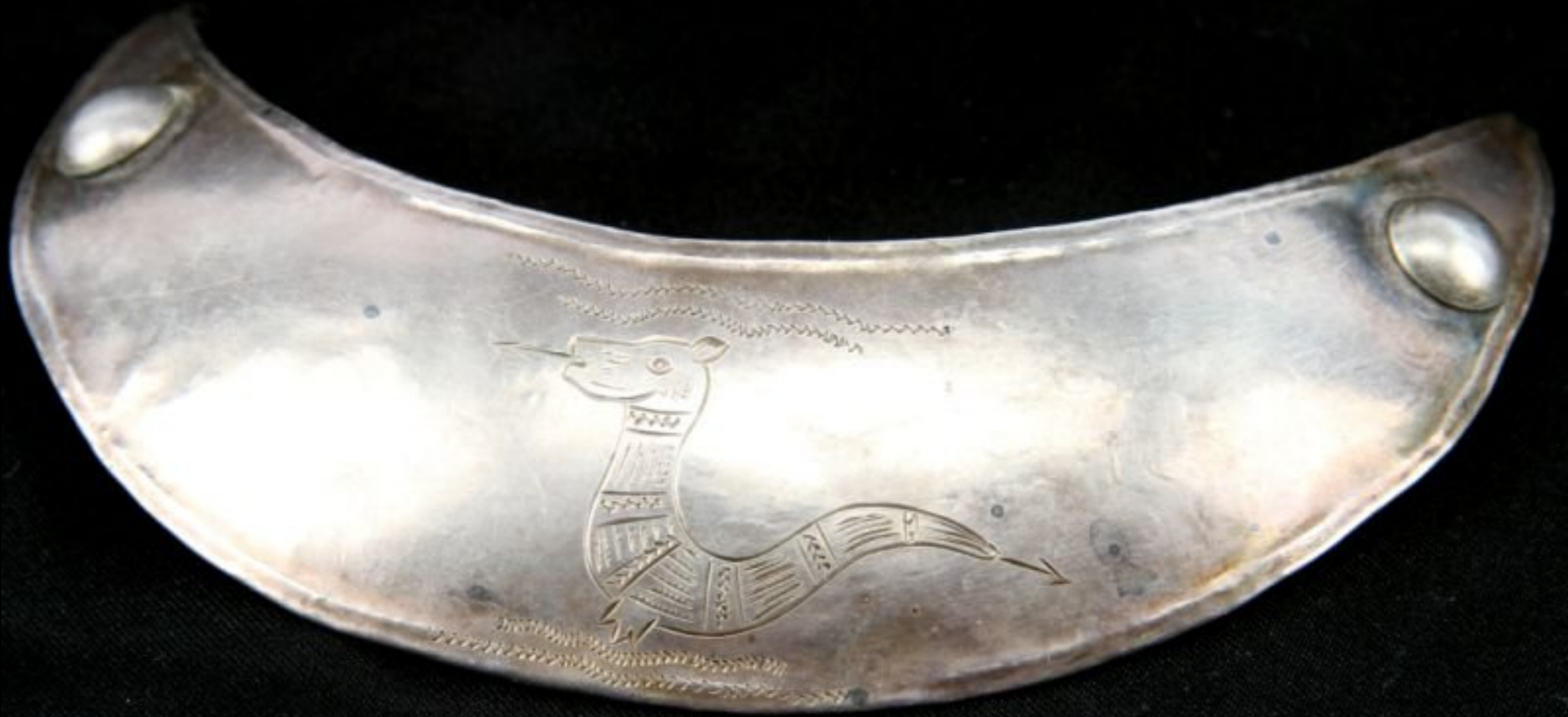
Native American Trade Silver Gorget 18th Century (Affiliated Auctions)