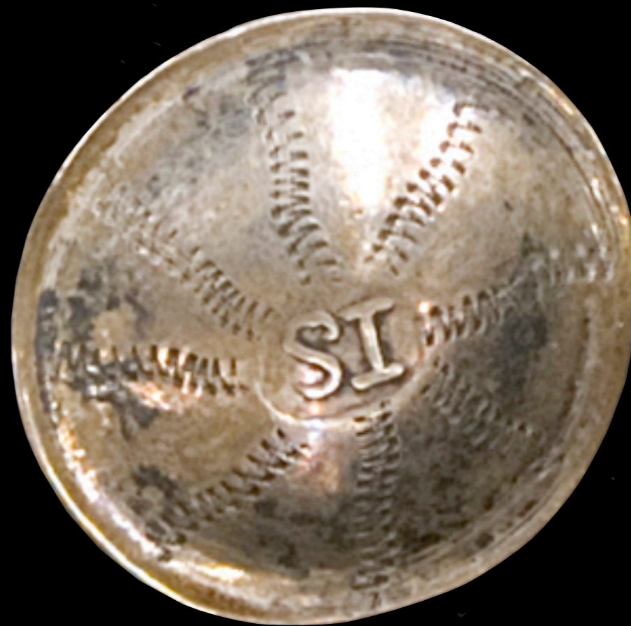
Native American Trade Silver Buttons Hallmarked "IM" & "SI" Late 18th Century (Clements Library)