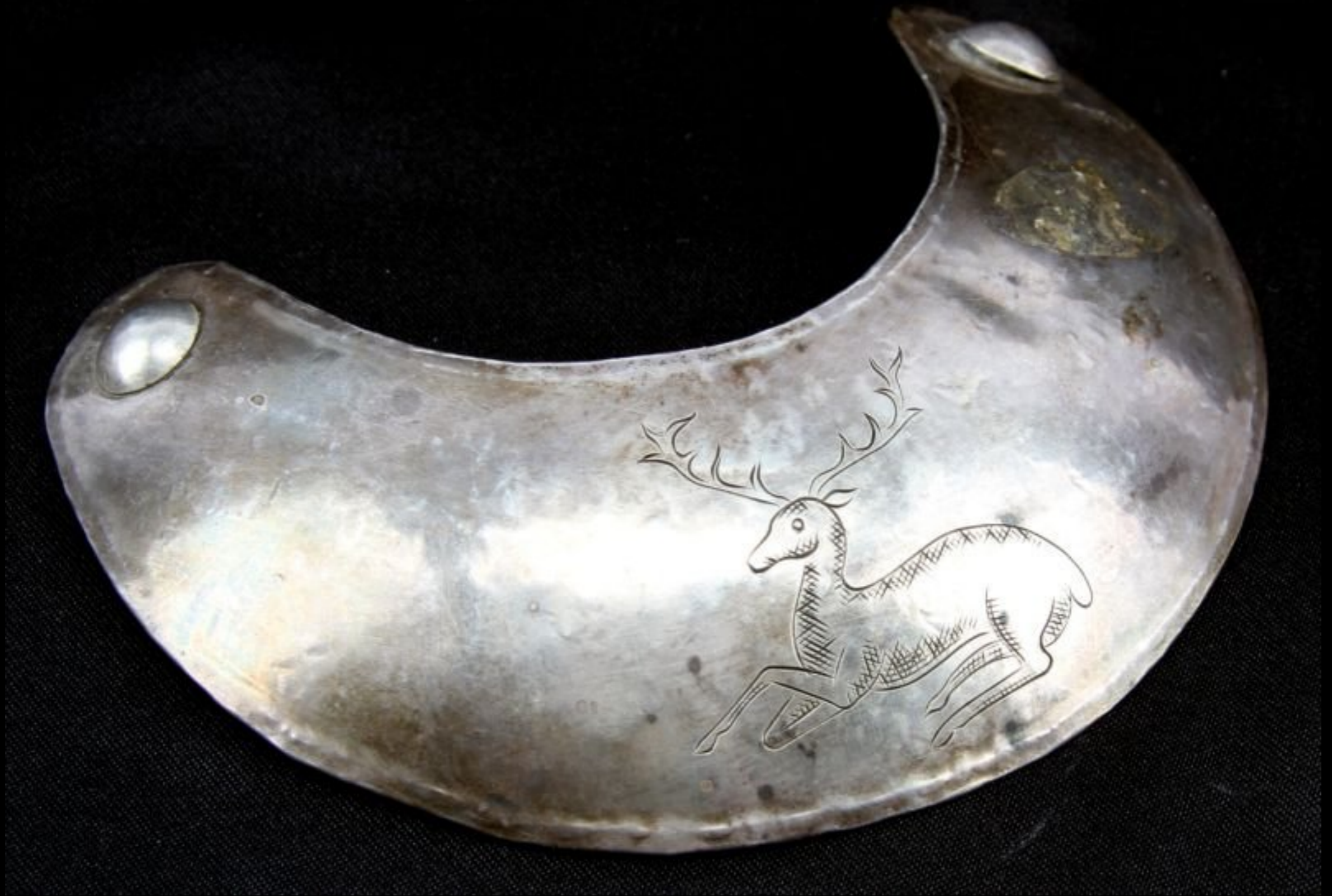
Native American Trade Silver Gorget 18th Century (Affiliated Auctions)