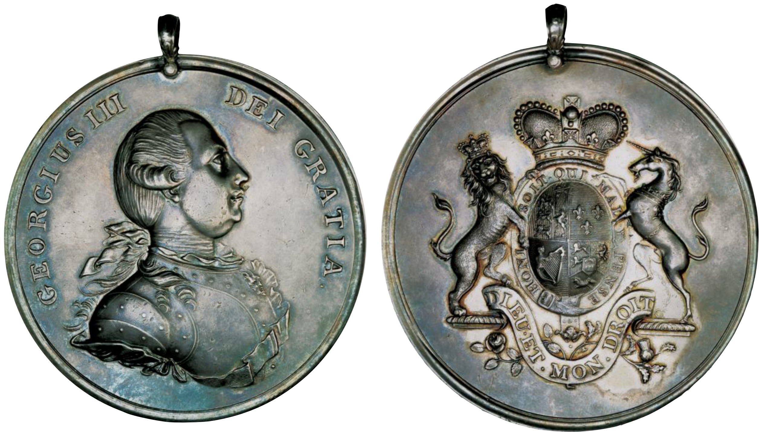
English King George III Silver Native American Trade / Peace Medal Third Obverse - Large Size (The John J. Ford, Jr. Collection - Stack's Bowers Galleries)