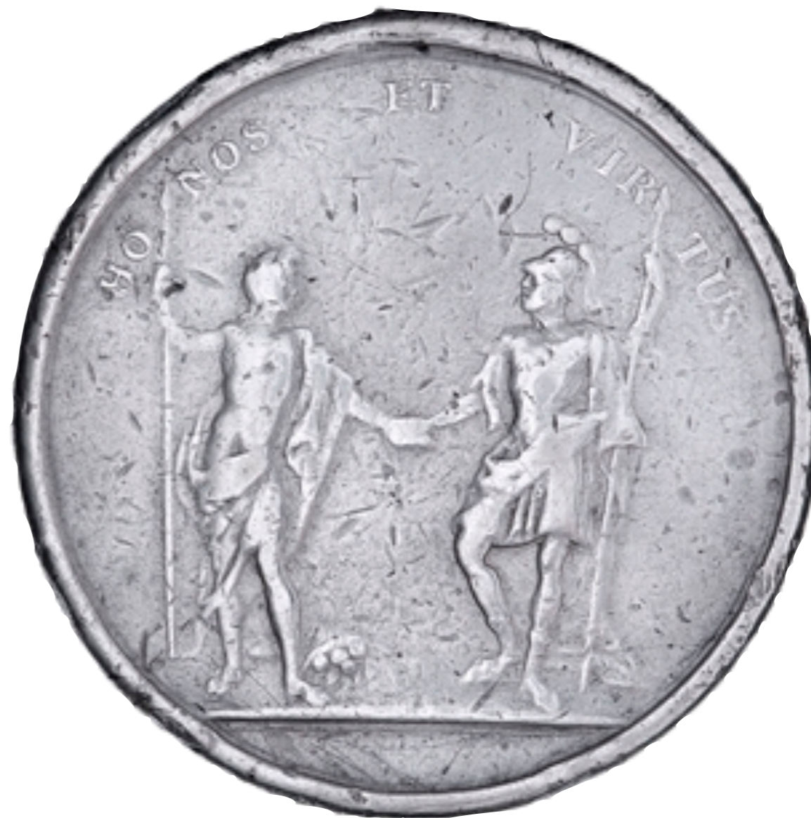
French King Louis XV Silver "HONOS ET VIRTUS" Native American Trade / Peace Medal