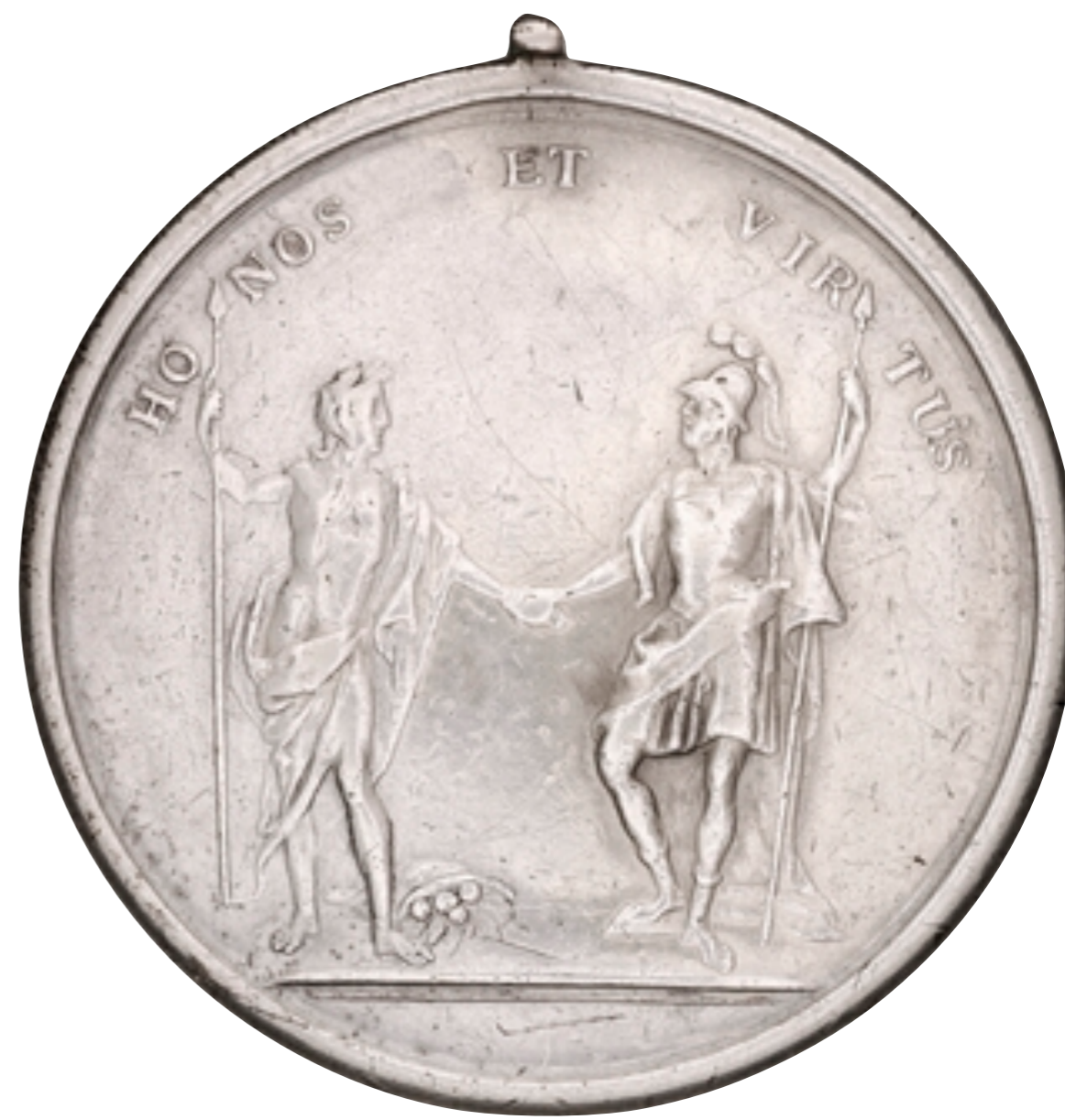
French King Louis XV Silver "HONOS ET VIRTUS" Native American Trade / Peace Medal c. 1715 / Re-Engraved for King George III (Mantis)