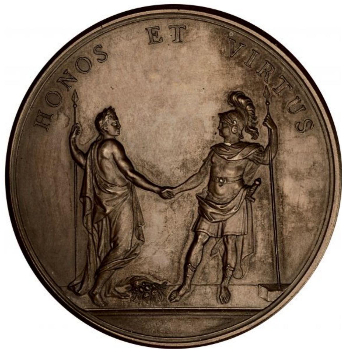
French Louis XIV Copper Native American Trade / Peace Medal c. 1693