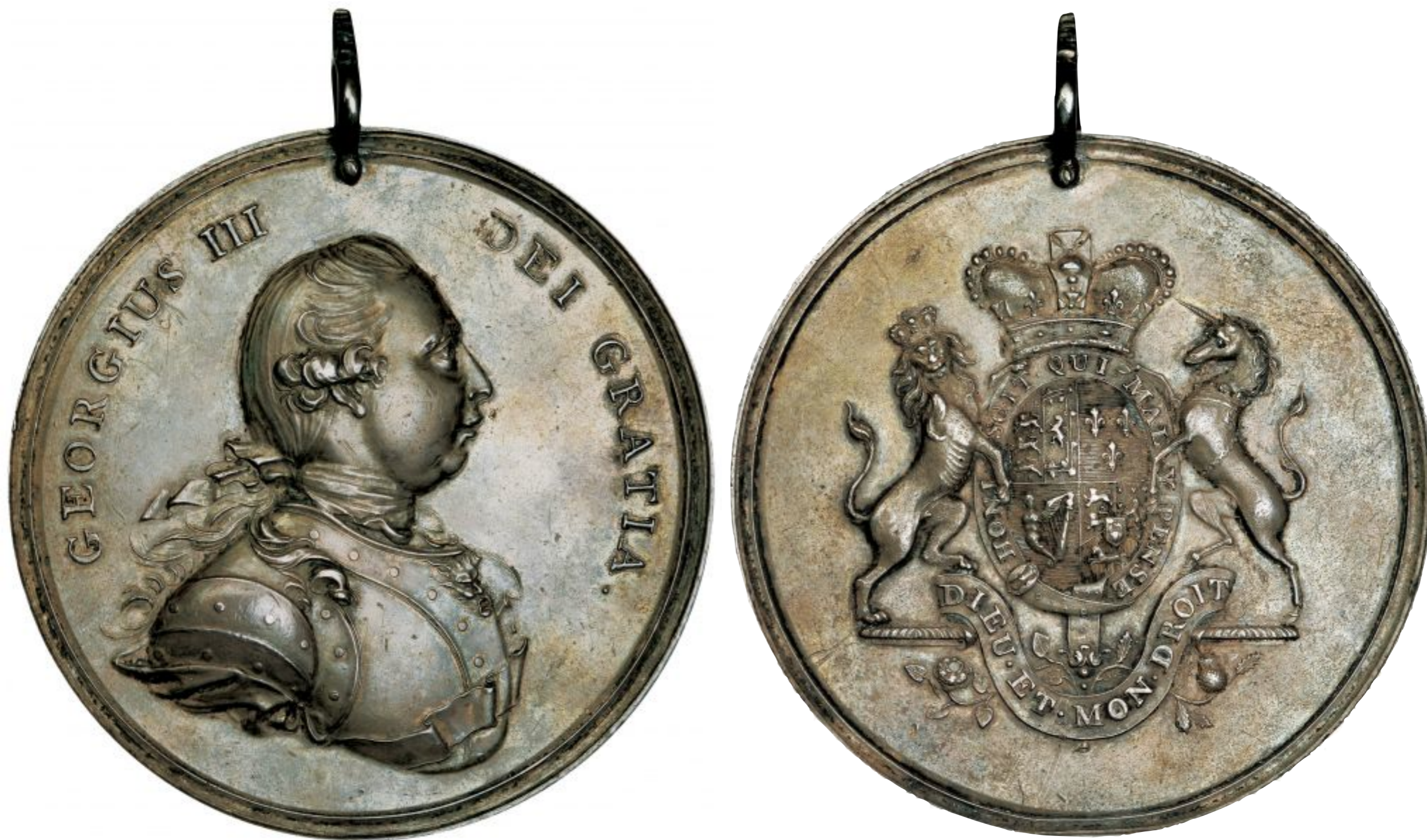
English King George III Silver Native American Trade / Peace Medal Large Size (The John J. Ford, Jr. Collection - Stack's Bowers Galleries)