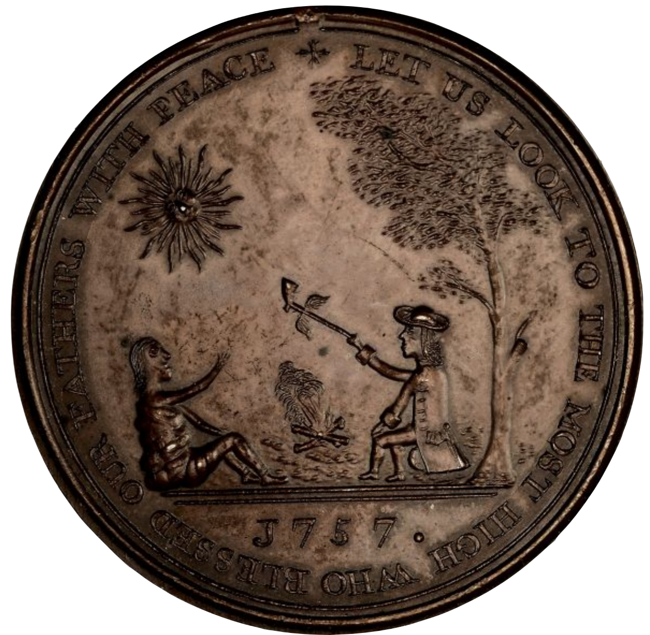
English King George II Bronzed Copper "Quaker", "Duffield", or "Treaty of Easton" Native American Trade / Peace Medal Struck Over a Spanish American 8 Reales 1757