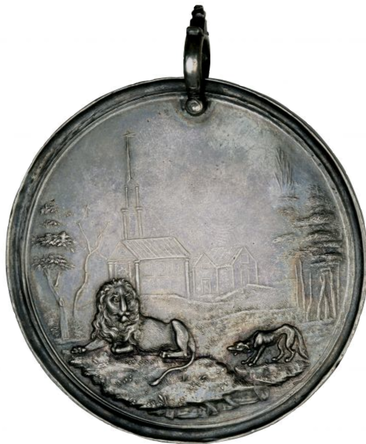
English King George III Silver "Lion and Wolf" Medal - Also Used as a Native American Trade / Peace Medal