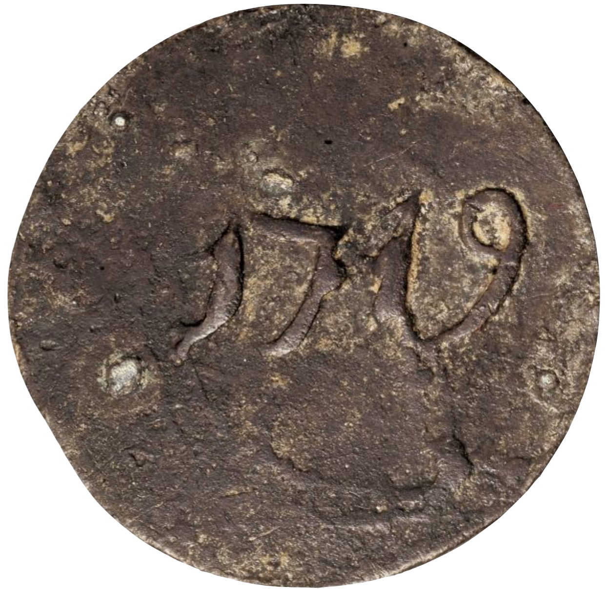
English "Archer" White Medal Token - Possible Native American Trade / Peace Medal