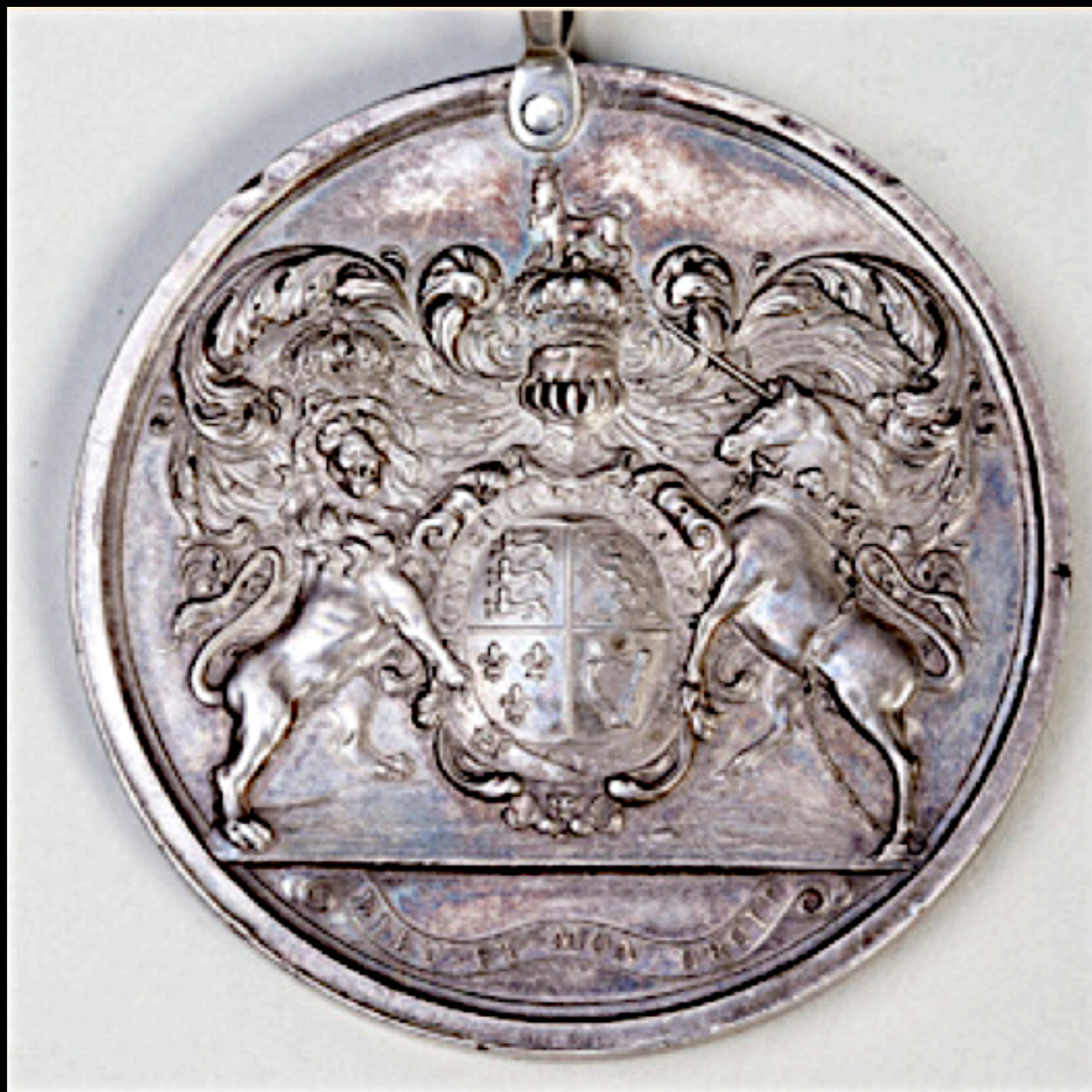
King Charles II - 1683 Indian Trade / Peace Medal 1683 (Gary Hendershott - Jon T. Ford Collection)