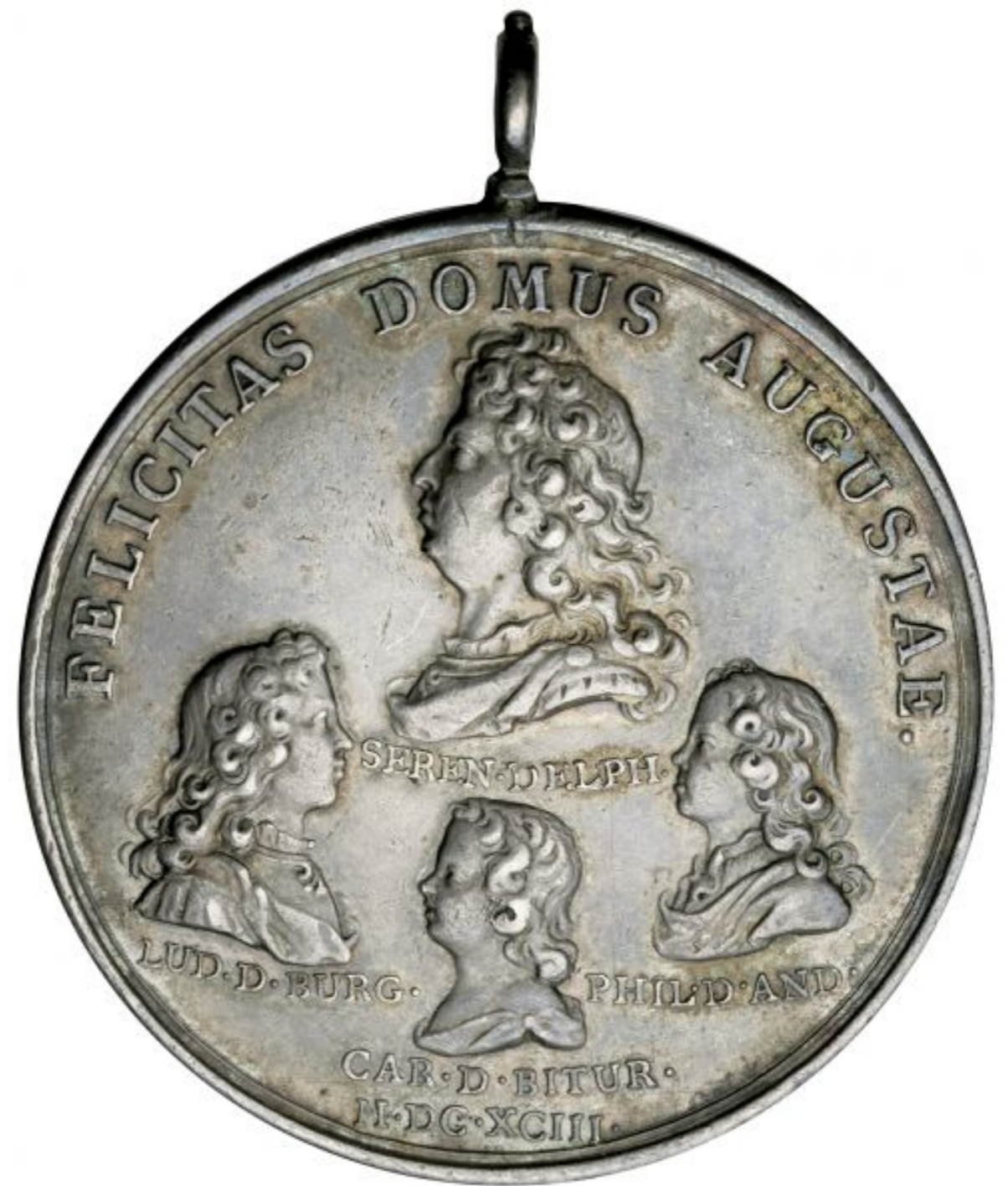
French Louis XIV Silver Native American Trade / Peace Medal