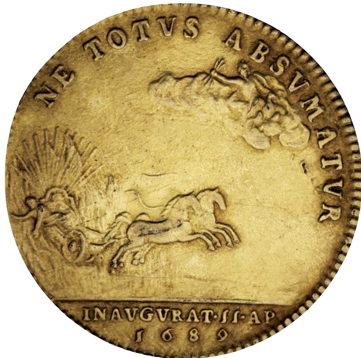
English William & Mary Silver Gilt Coronation Medal - Also Used as a Native American Trade / Peace Medal