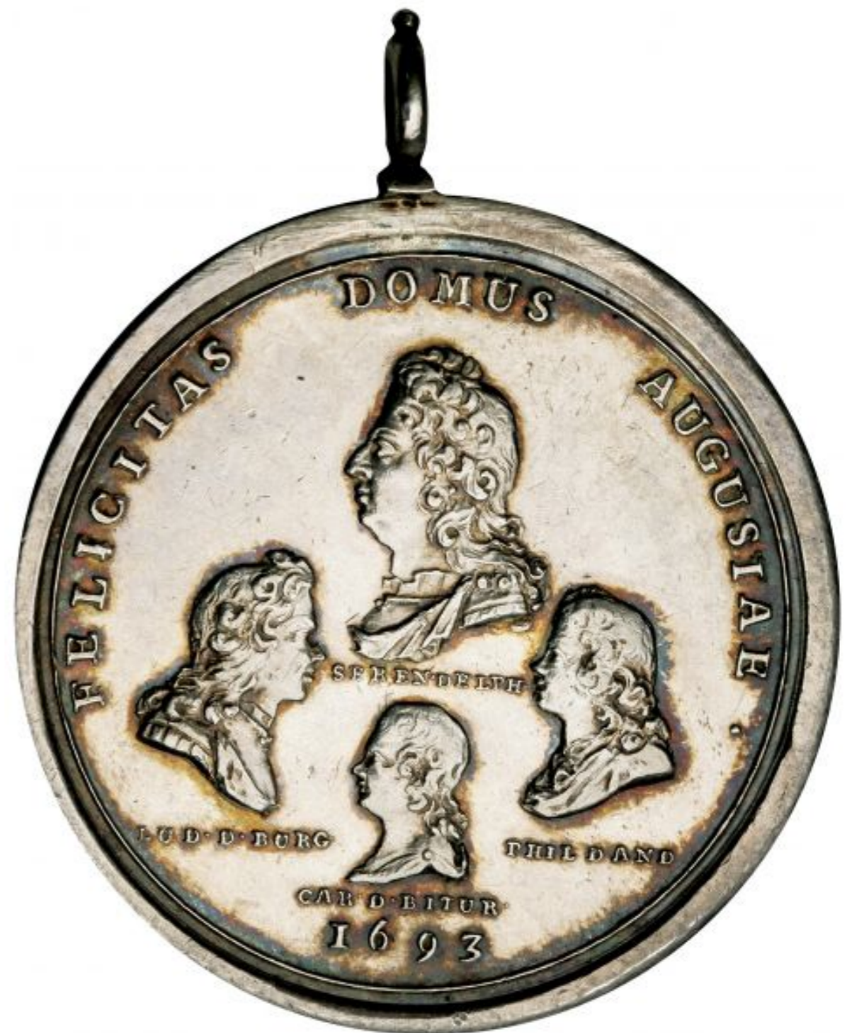
French Louis XIV Silver Native American Trade / Peace Medal 1693