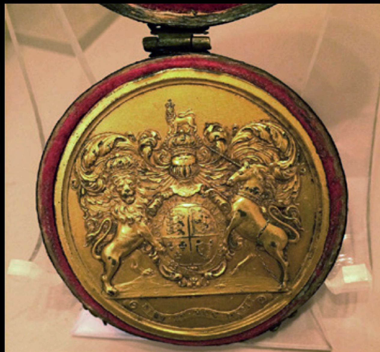
English Charles II Gilt Bronze Medal - Also Used as a Native American Trade / Peace Medal 1683