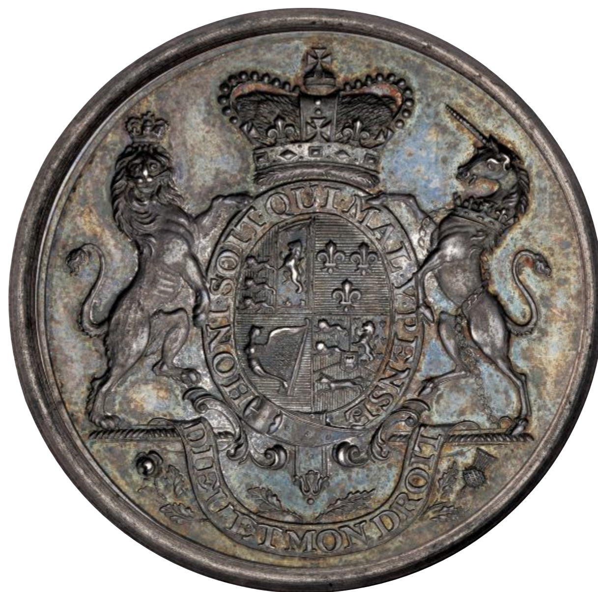
English King George III & Queen Charlotte Silver Medal - Also Used as a Native American Trade / Peace Medal