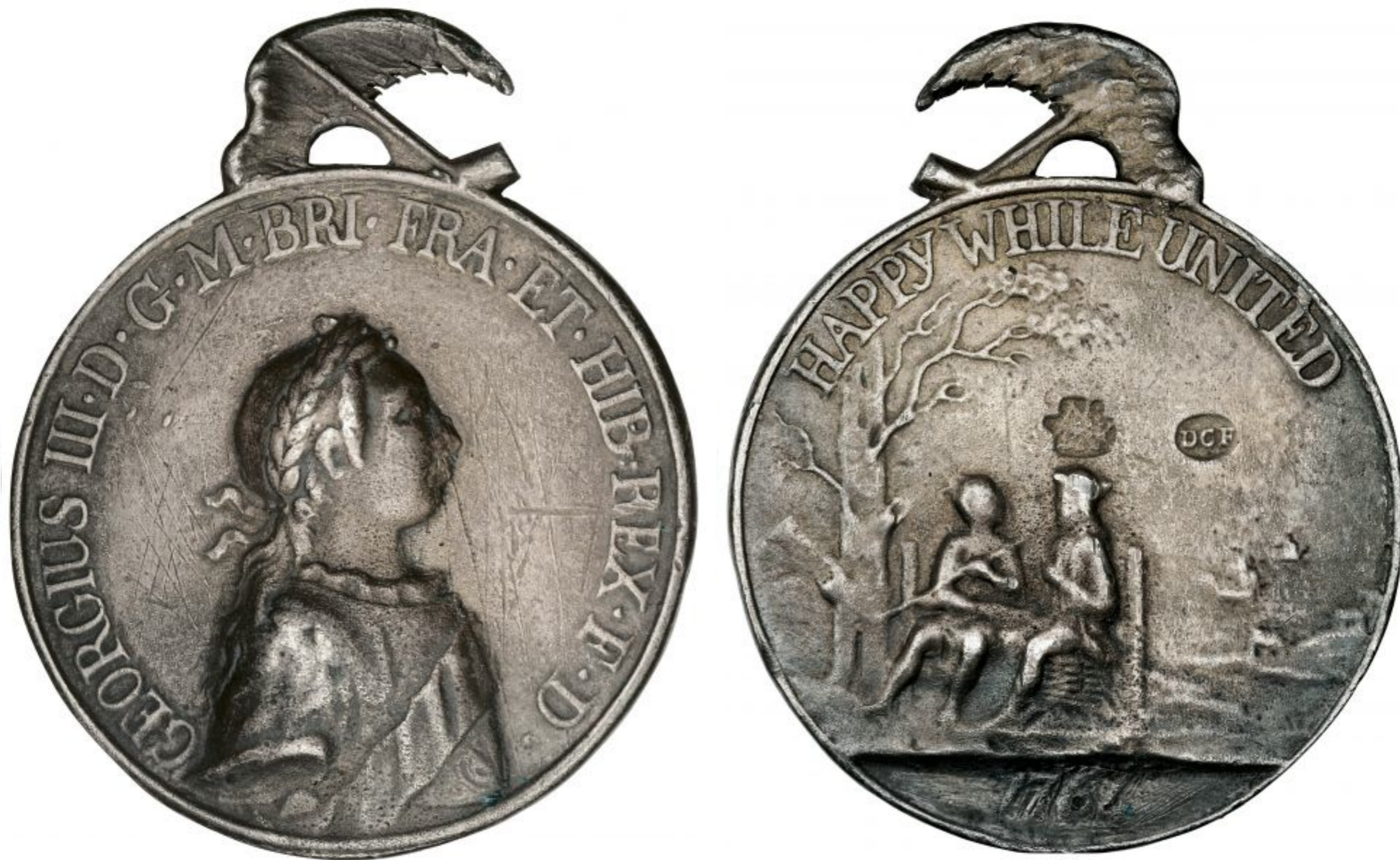
New York King George III White Metal "HAPPY WHILE UNITED" Native American Trade / Peace Medal Stamped "N YORK" & Signed "DCF" for Daniel Christian Fueter, New York City Silversmith 1764