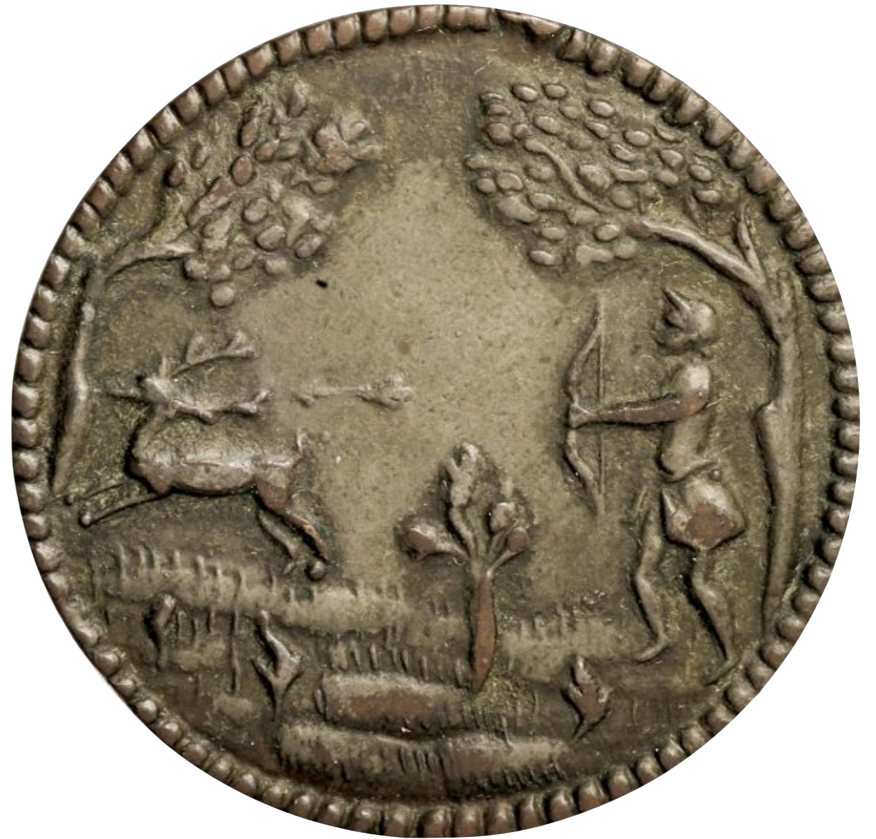
English King George II Brass Native American Trade / Peace Medal