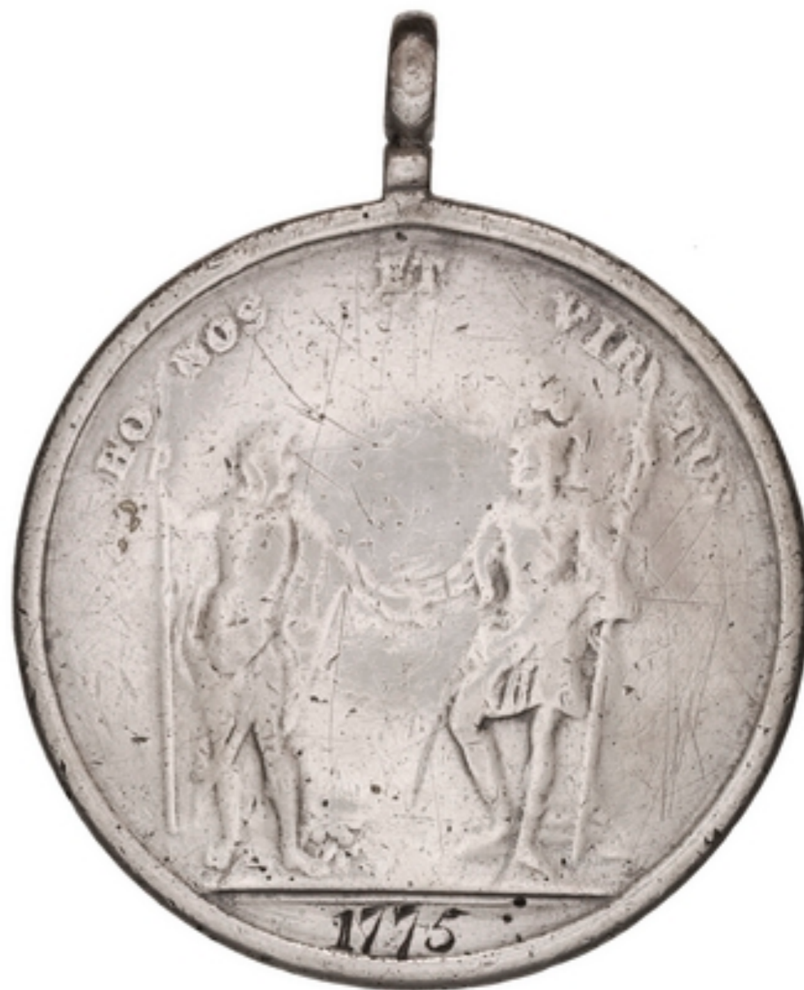
French King Louis XV Silver "HONOS ET VIRTUS" Native American Trade / Peace Medal Re - Engraved for King George III c. 1715 - 1774 / Re - Engraved 1775 (Mantis)