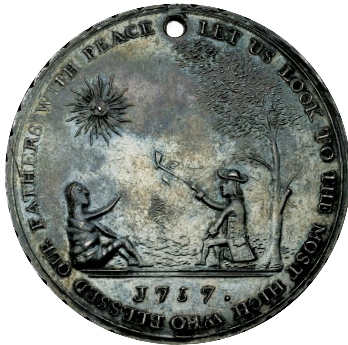
English King George II Silver "Quaker", "Duffield", or "Treaty of Easton" Native American Trade / Peace Medal Struck Over a Spanish American 8 Reales 1757 (The John J. Ford, Jr. Collection - Stack's Bowers Galleries)