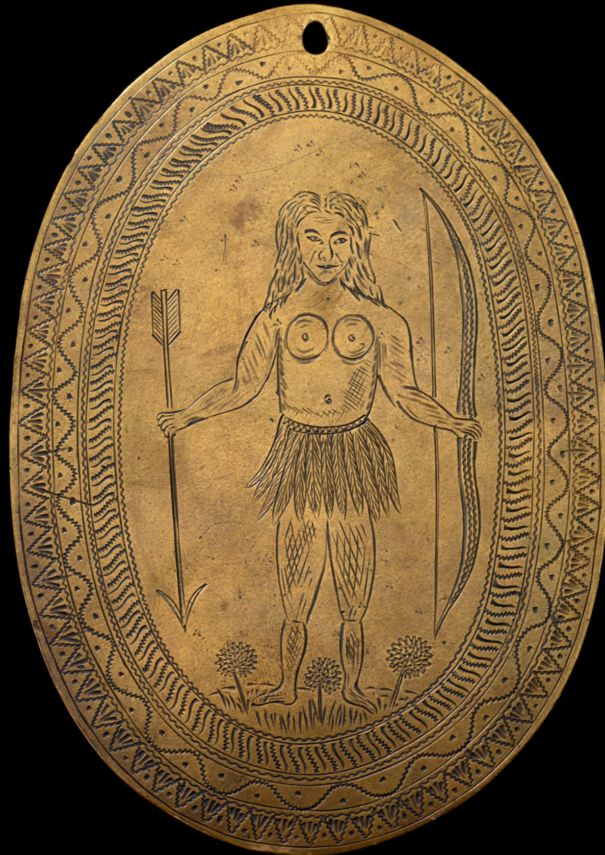
Massachusetts Bay Colony Peace Medal King Phillip's War - 1676 (Smithsonian - National Museum of the American Indian)