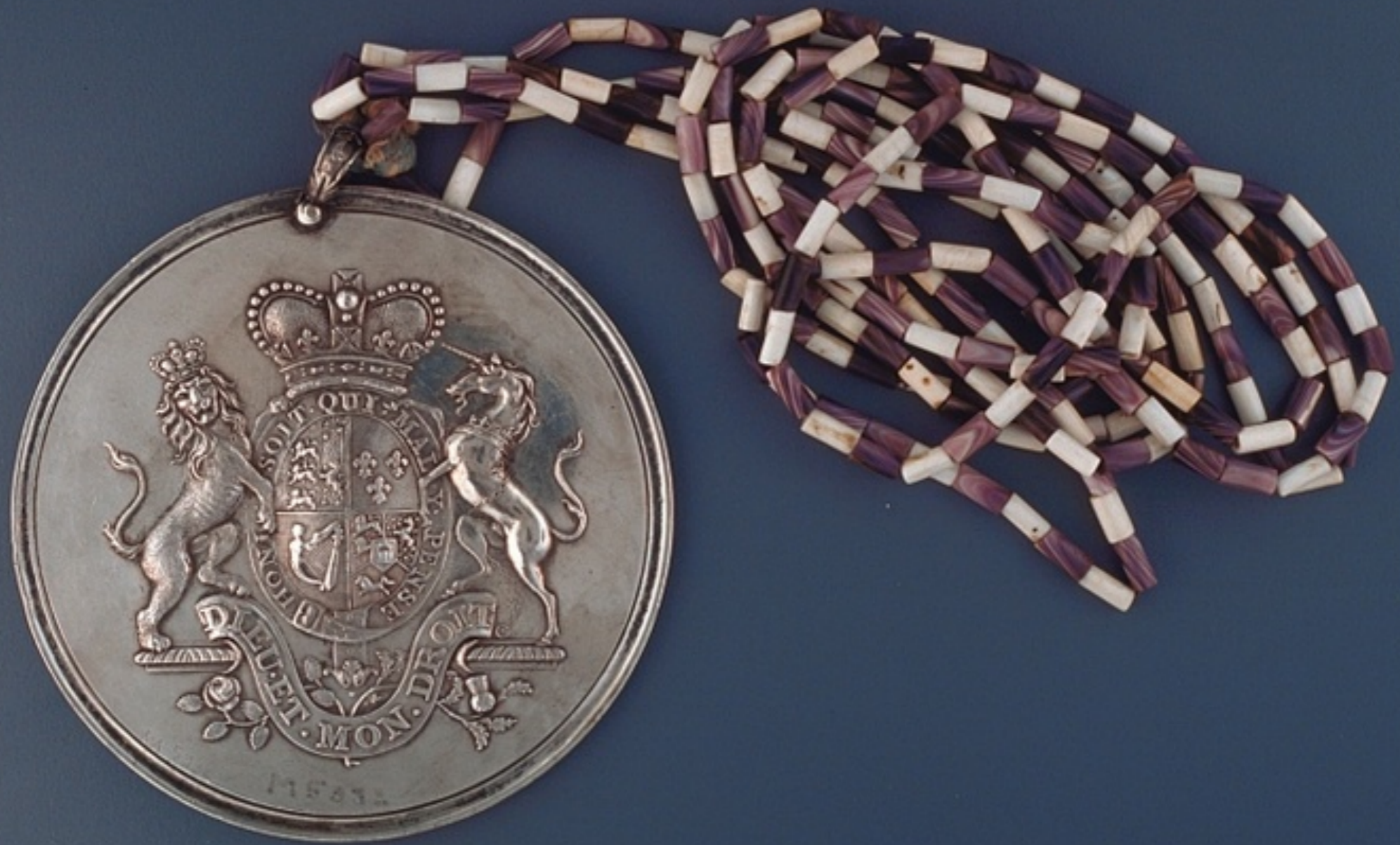
British / First Nations Trade / Peace Medal with Wampum c. 1763 - 1789 (McCord Museum, Montreal)