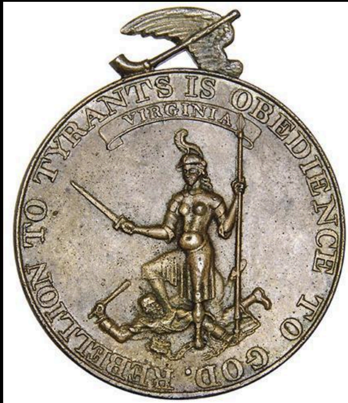
Virginia "Happy While United" Indian Trade / Peace Medal by Robert Scot per the Order of Governor Thomas Jefferson in 1780 (Colonial Williamsburg Foundation)