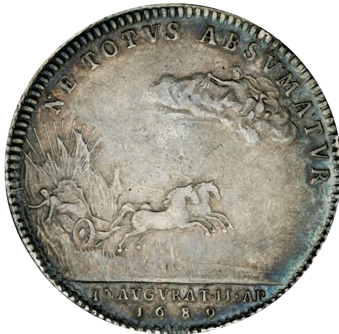
English William & Mary Silver Coronation Medal - Also Used as a Native American Trade / Peace Medal