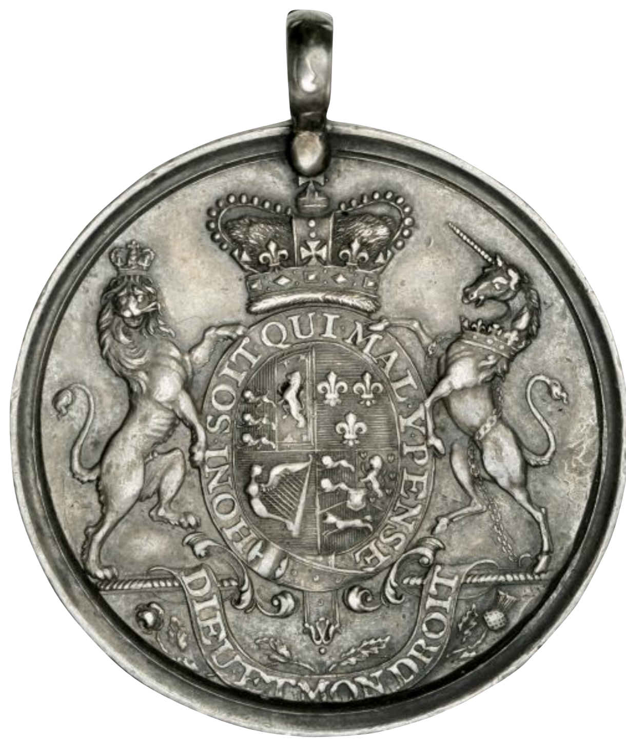
English King George III Silver Native American Trade / Peace Medal Small Size (The John J. Ford, Jr. Collection - Stack's Bowers Galleries)