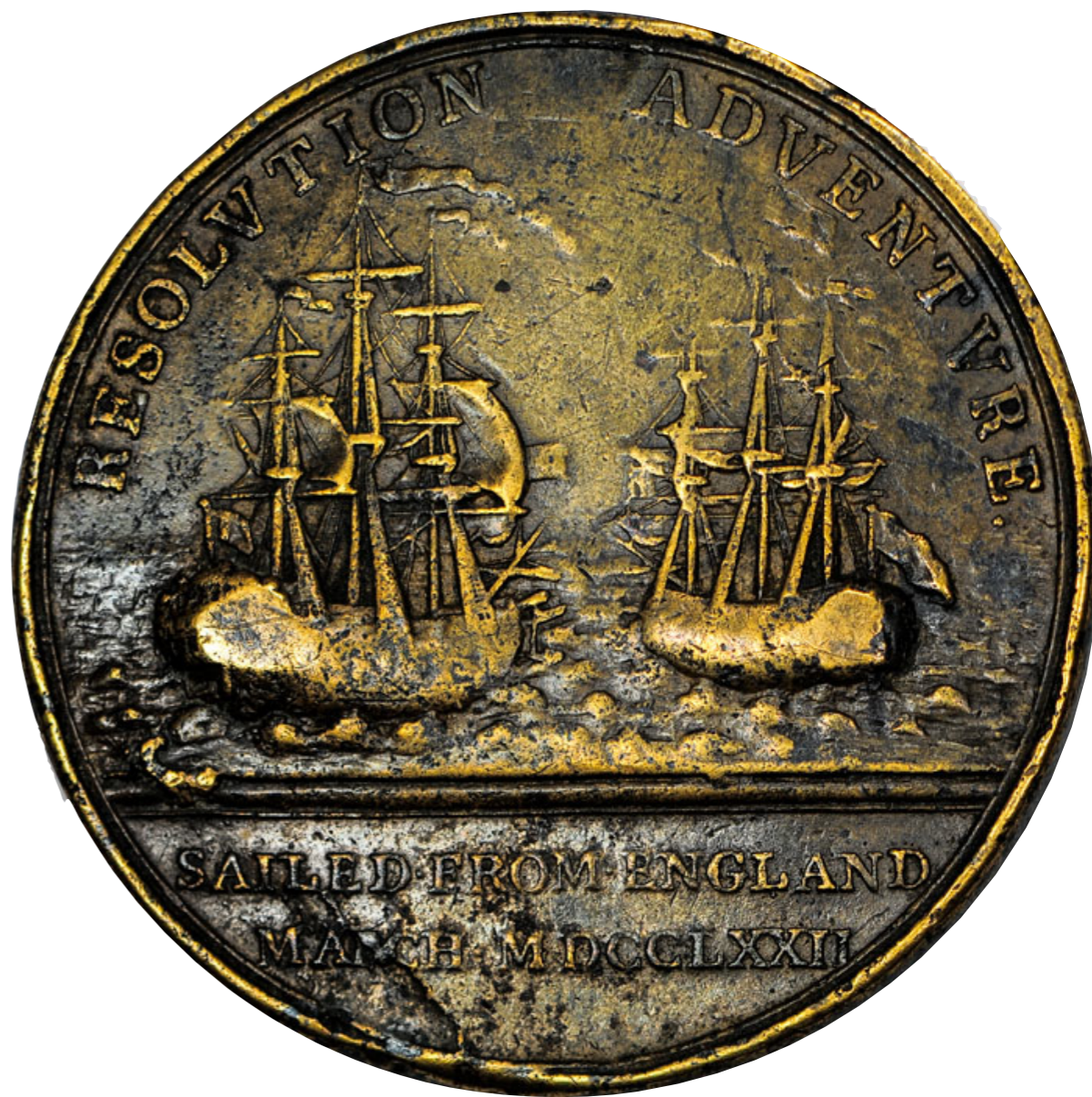
English King George III Yellow Metal Native American Trade / Peace Medal Traded to the Native Hawaiians by Cook 1772