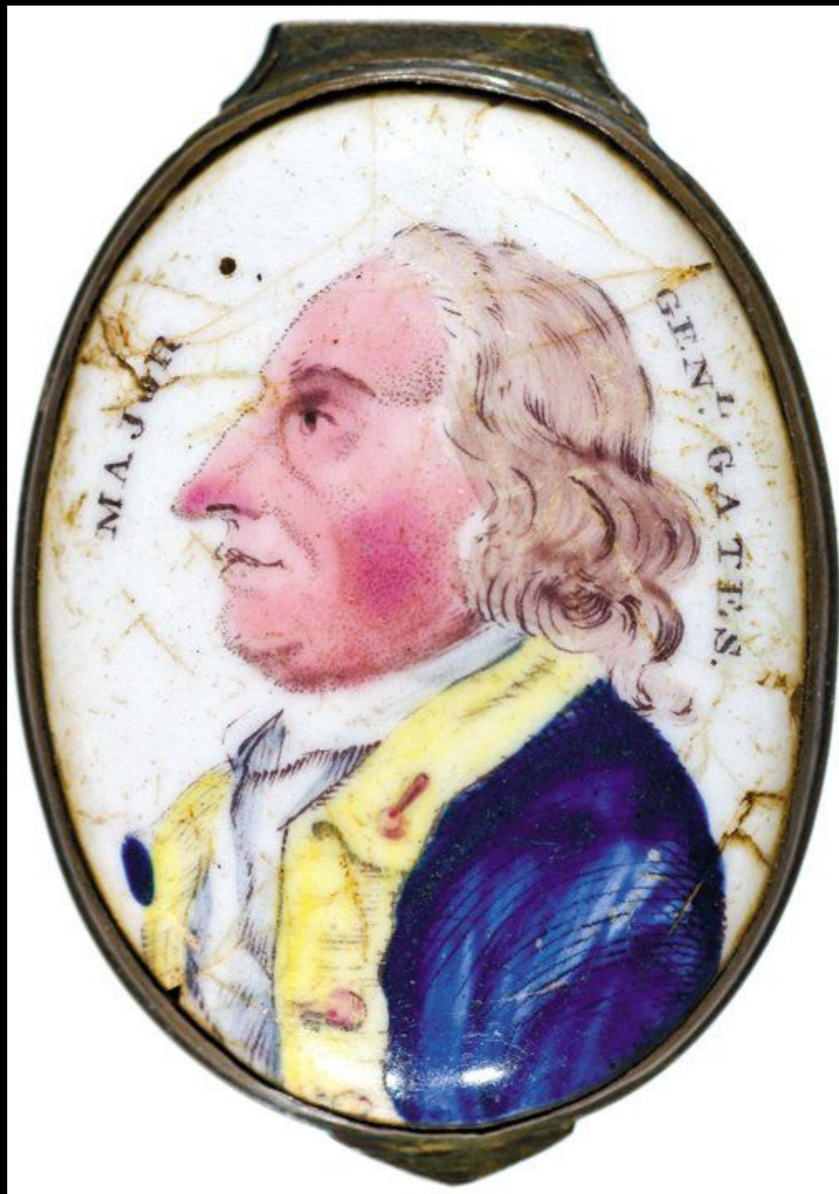
English "MAJOR GENL GATES" Enamel Patch or Snuff Box c. 1776 (Early American Auctions)