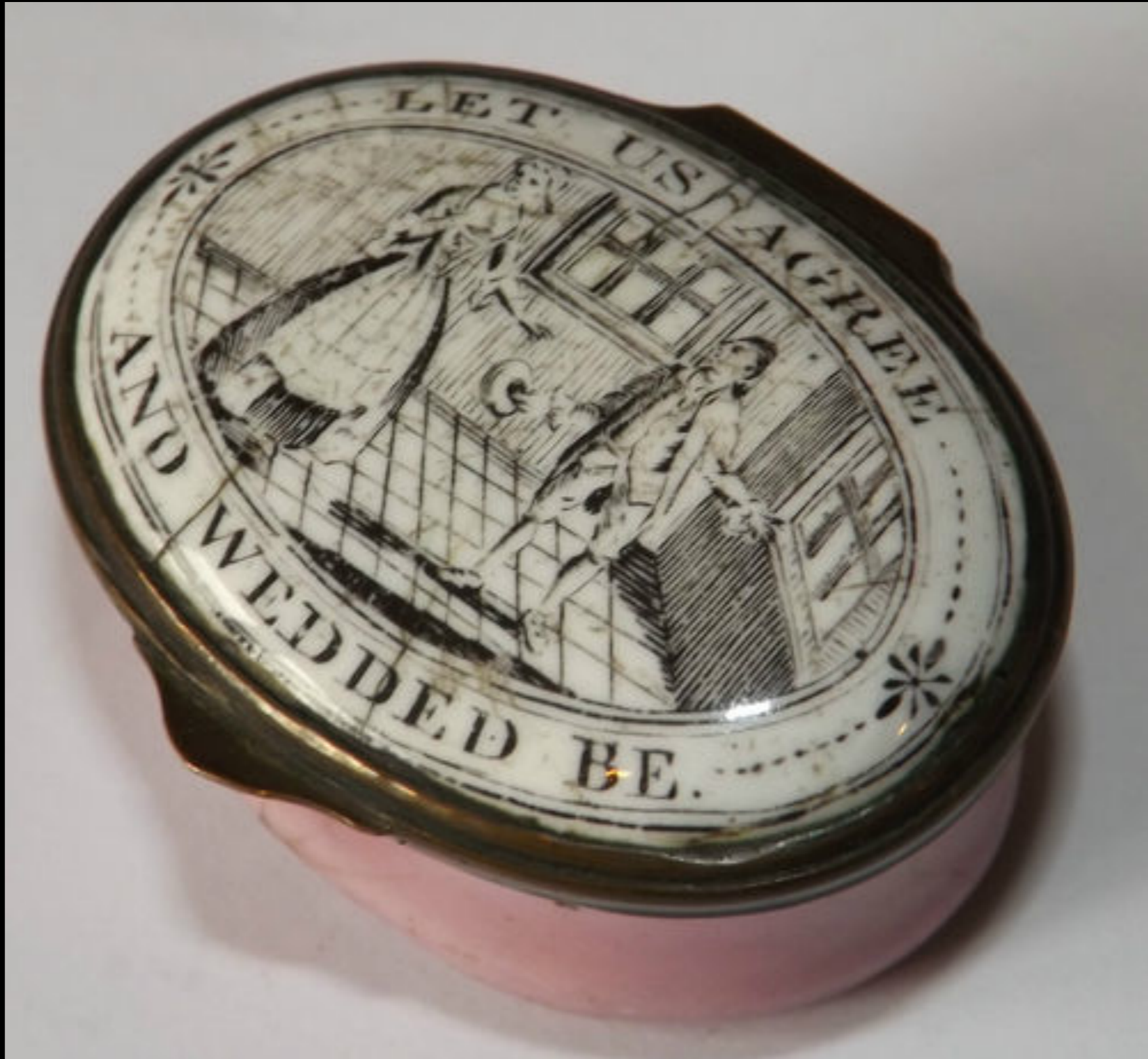
English Enamel Patch Box from Bilston or Staffordshire c. 1780 (Private Collection)