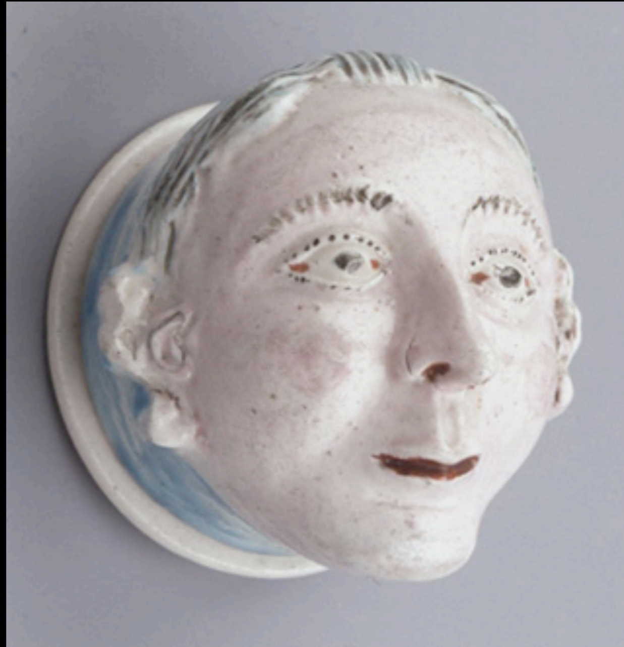
English Enamel Patch Box