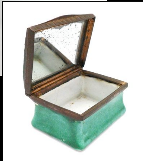
Bilston Enamel Patch Box c. 1770 - 1780 (Private Collection)