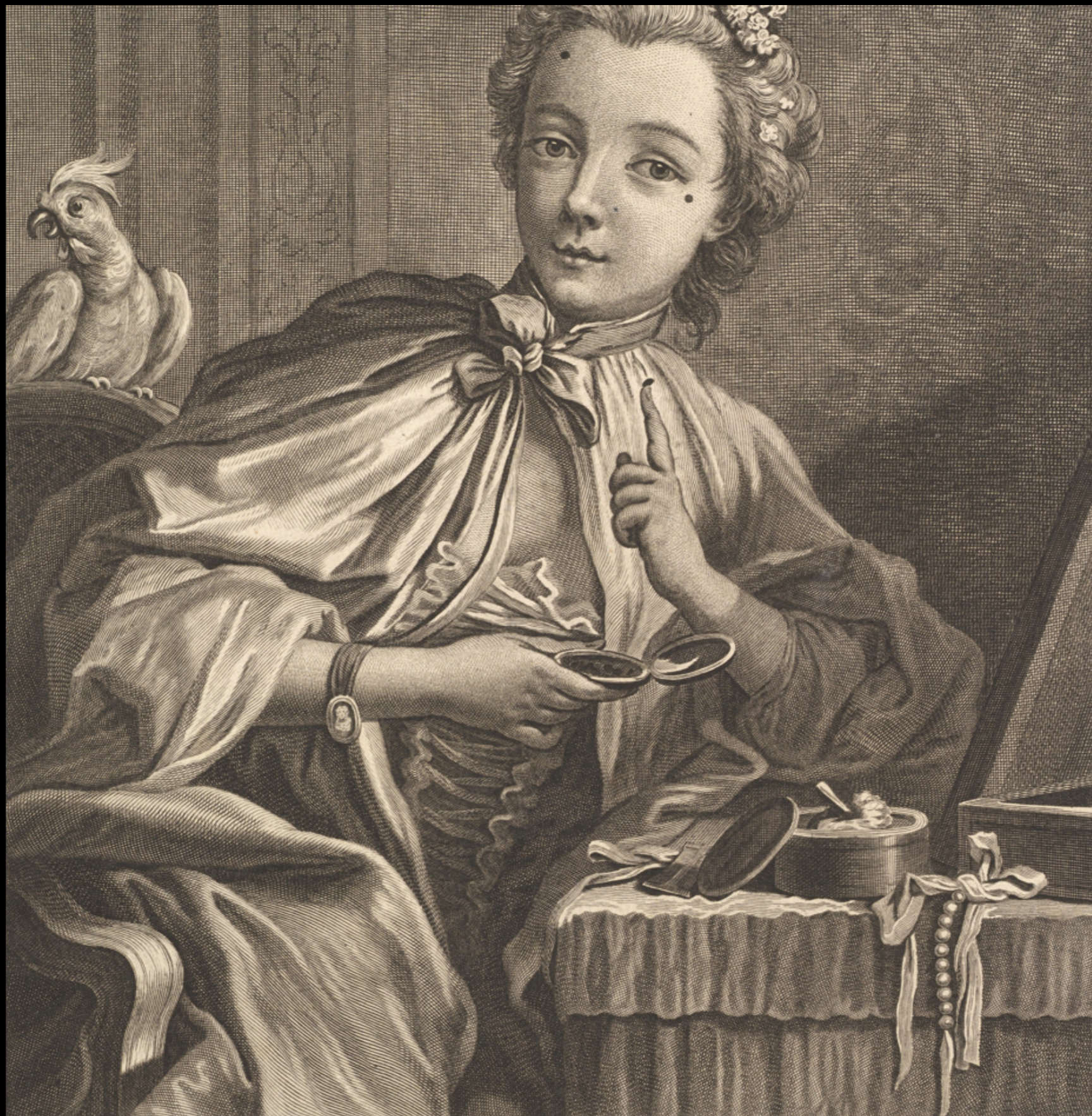
“LE MATIN La Dame a sa Toilete” by Gilles Edme Petit after François Boucher Mid 18th Century (Metropolitan Museum of Art)