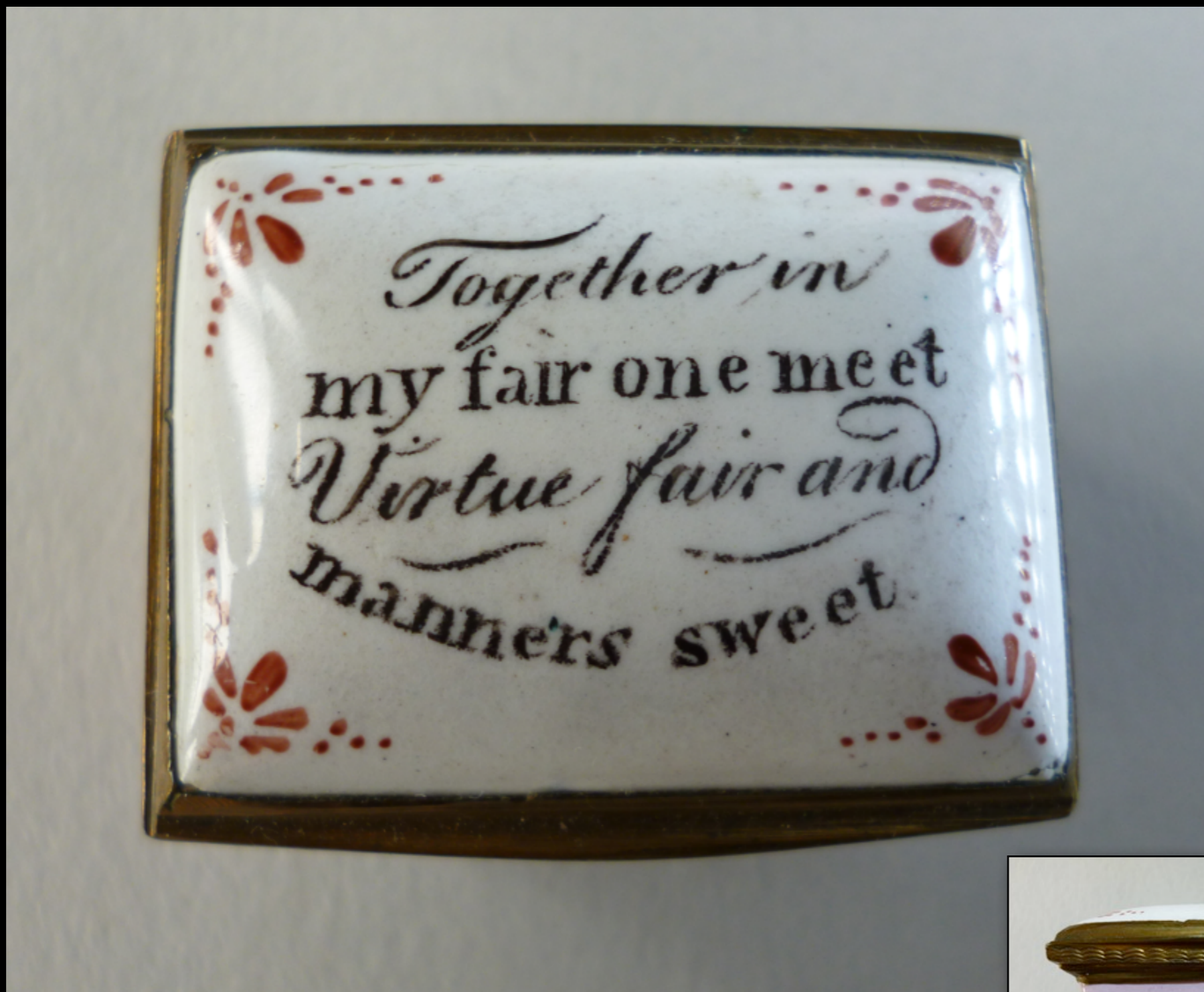
A Bilston Enamel Patch Box c. 1780 (Private Collection)