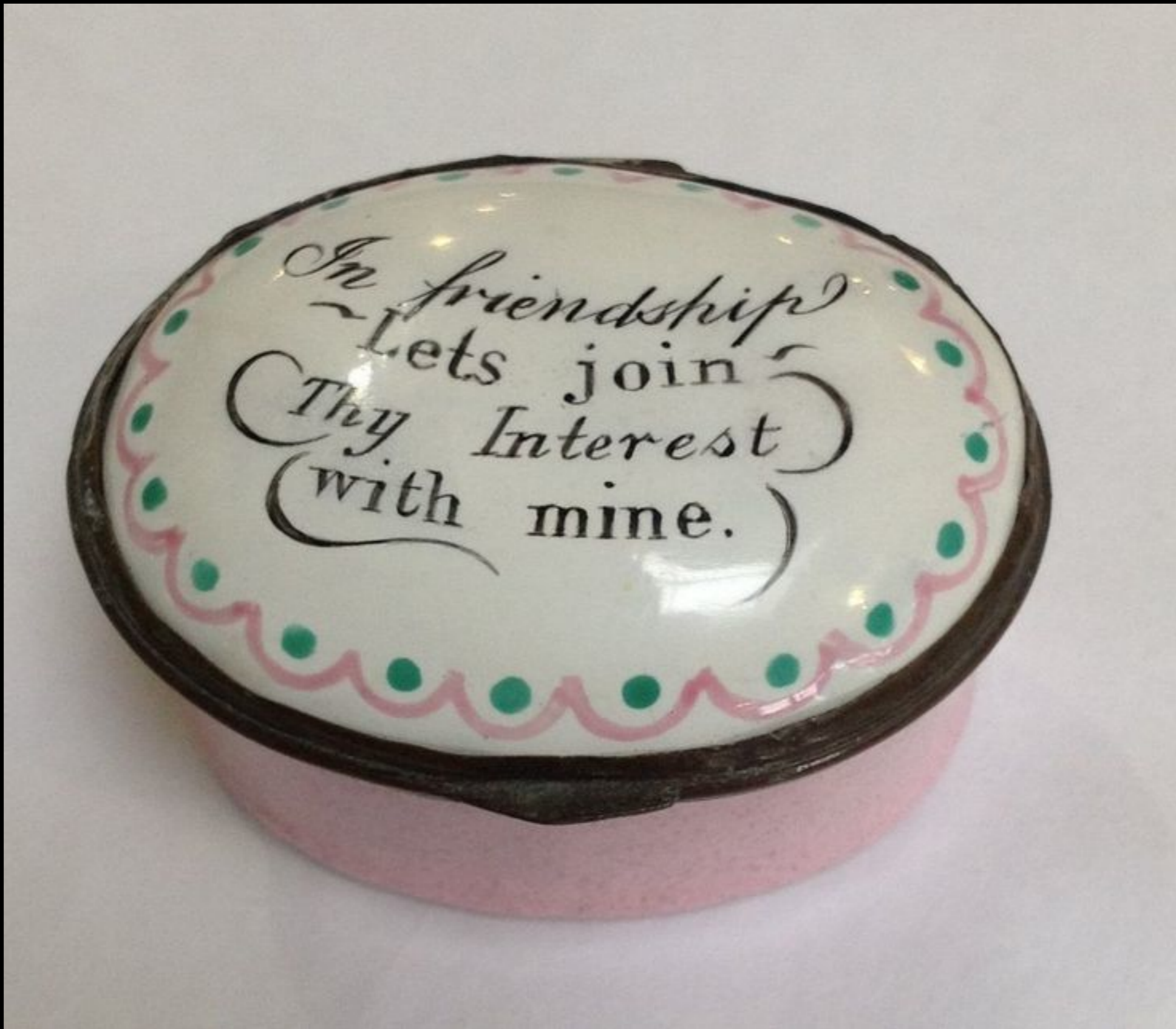
English Enamel Patch Box