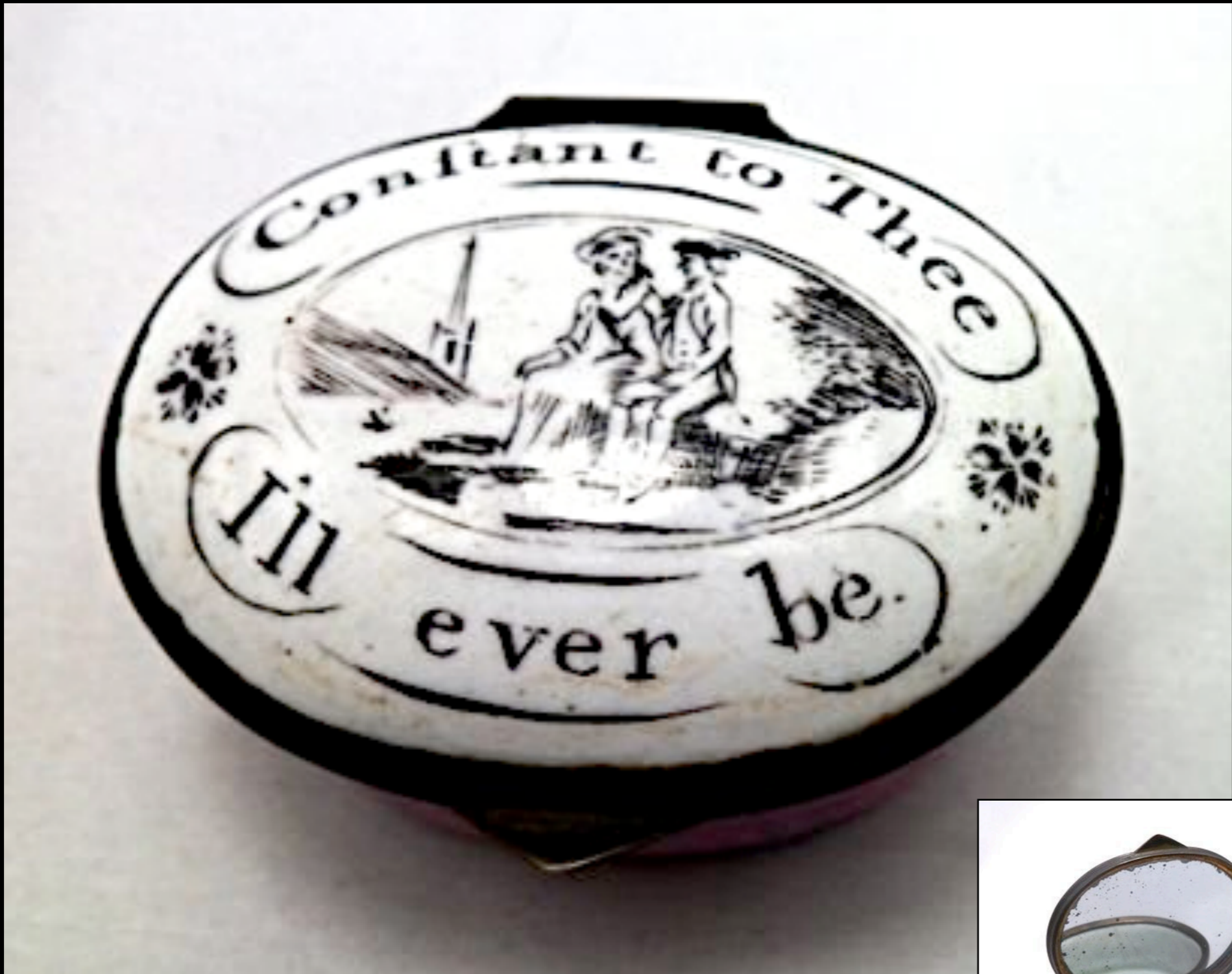
English Enamel Patch Box c. 1780 (Private Collection)