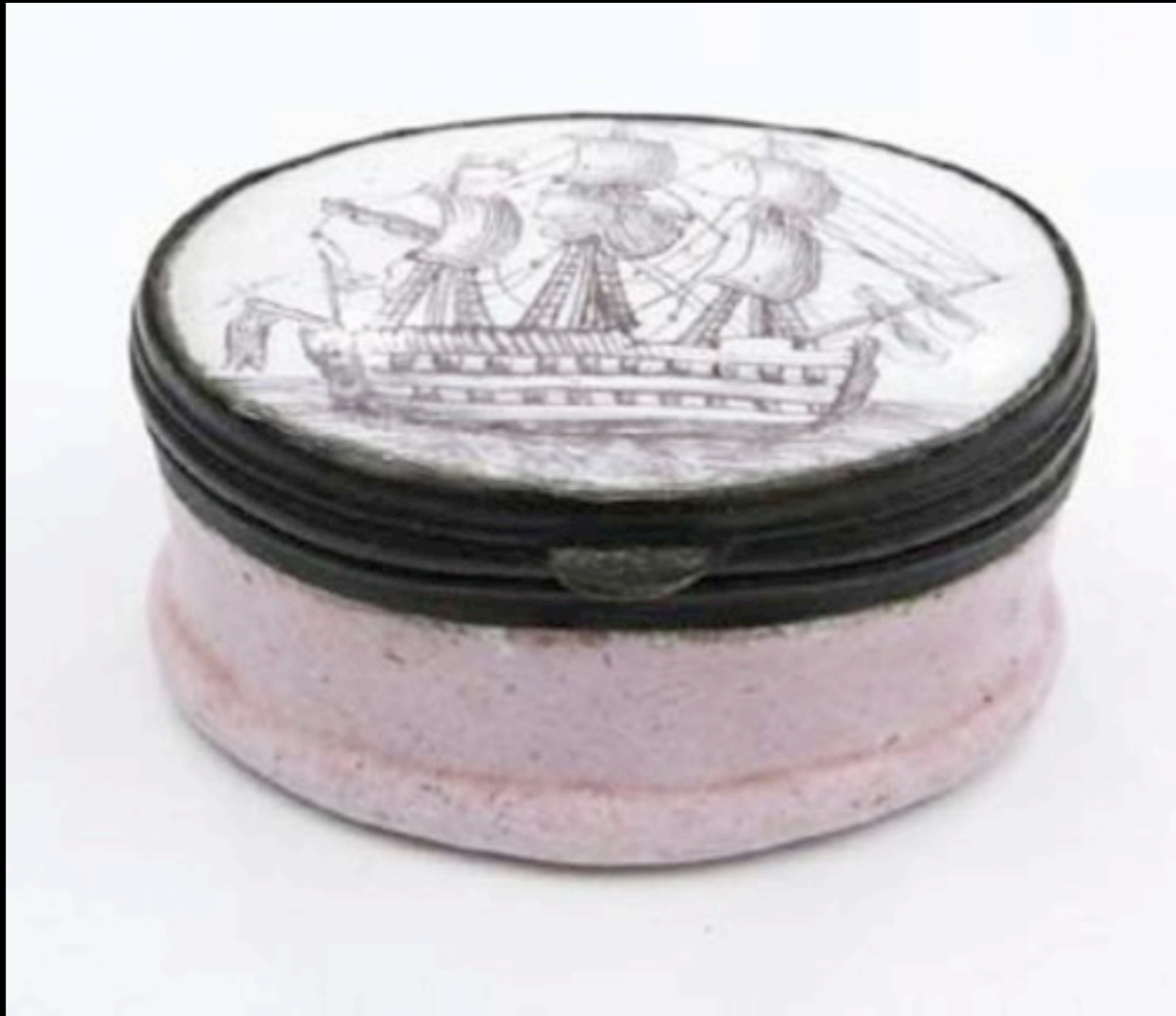
English Enamel Patch Box