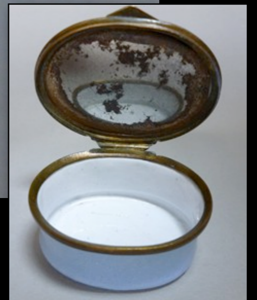
English Enamel Patch Box c. 1780 (Private Collection)