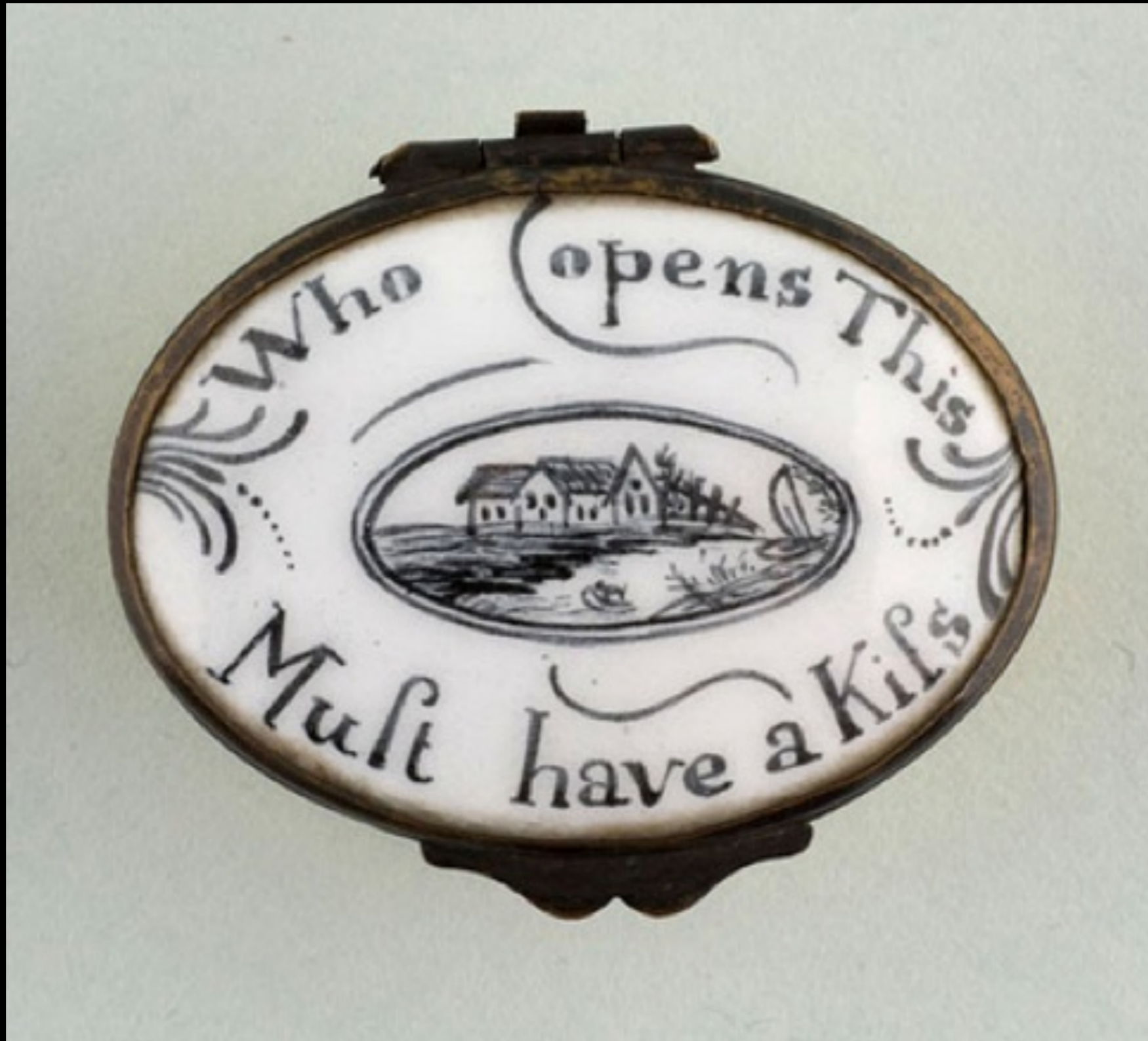
English Enamel Patch Box c. 1780 (Private Collection)