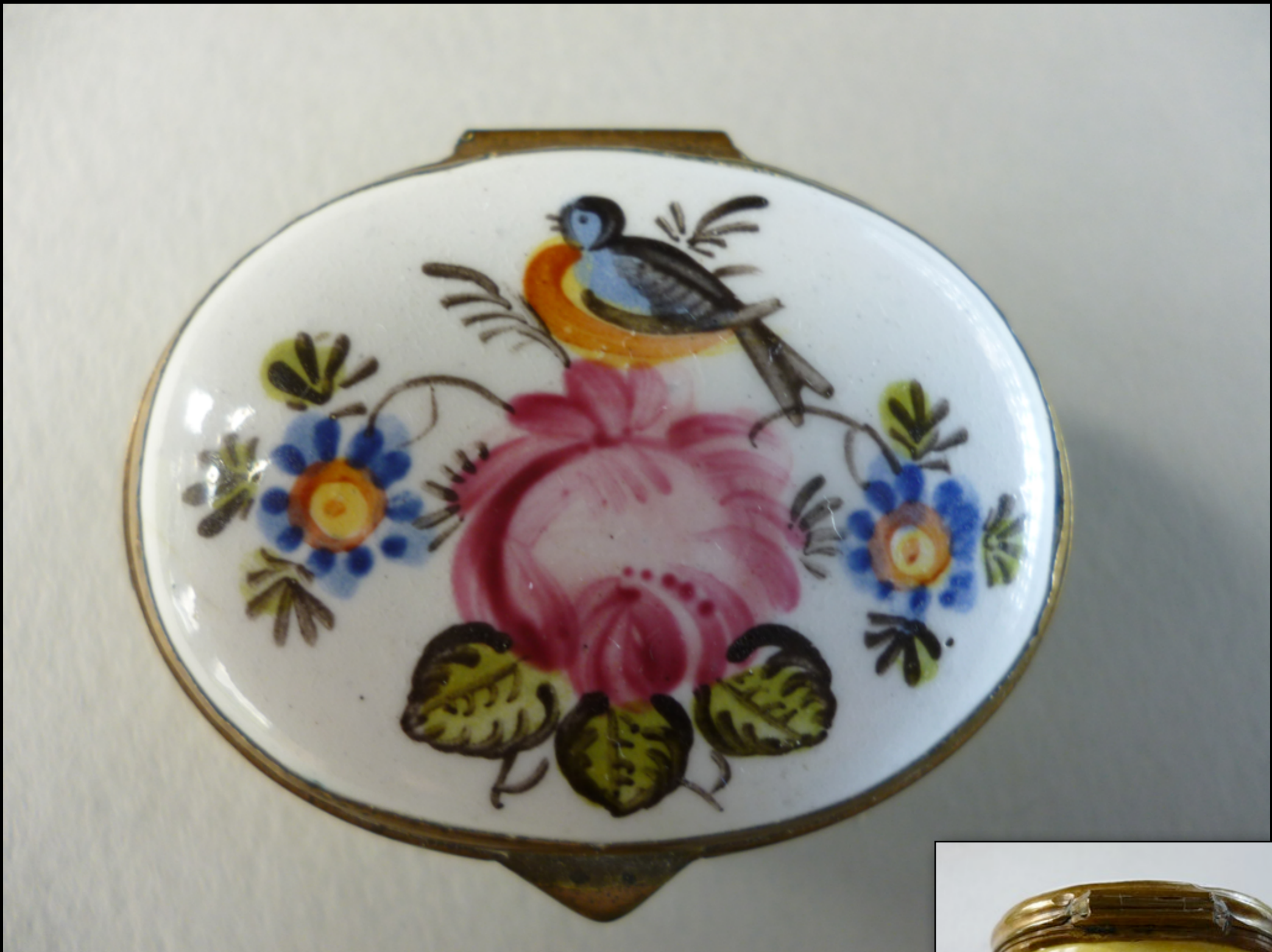
English Enamel Patch Box c. 1780 (Private Collection)