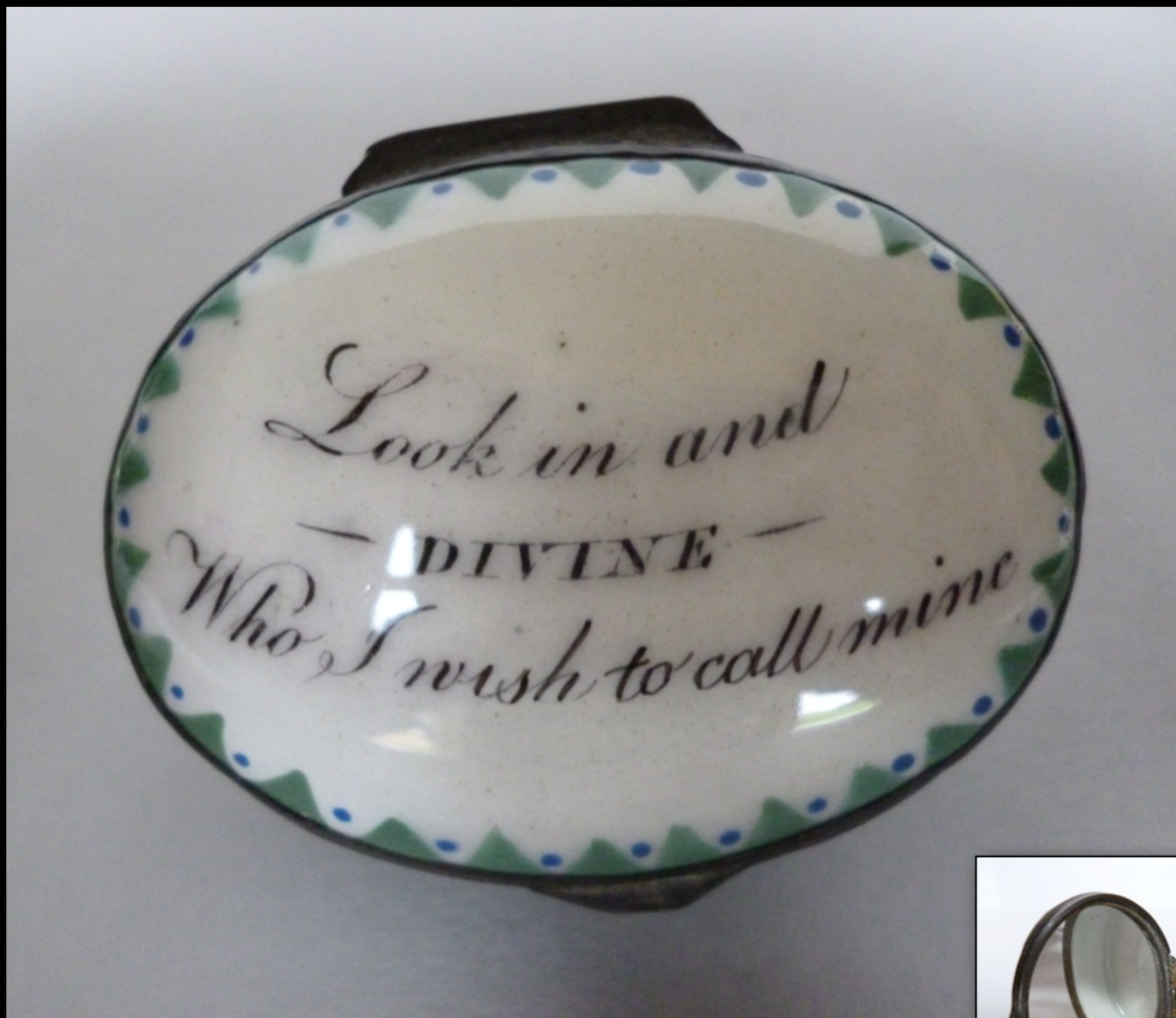
A Bilston Enamel Patch Box c. 1780 (Private Collection)