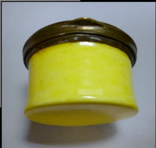
A Bilston Enamel Patch Box c. 1780 (Private Collection)