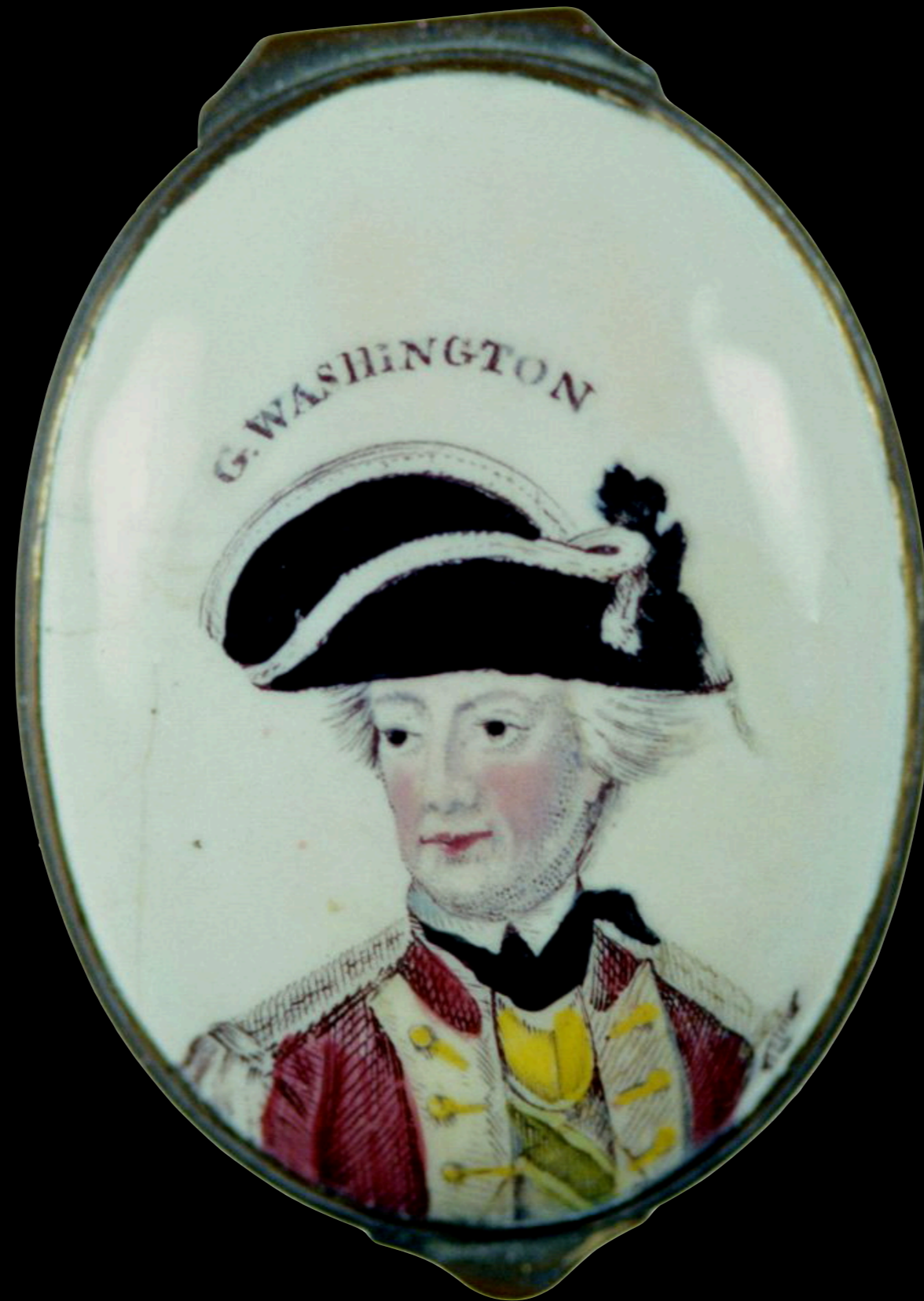
English "G. Washington" Enamel Patch or Snuff Box c. 1780 (Private Collection)