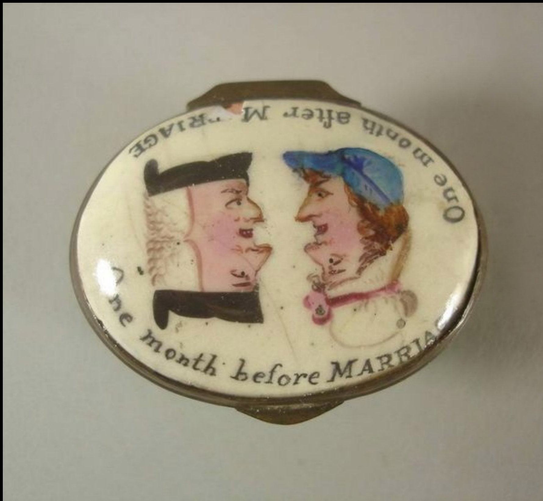
English Bilston Enamel Patch Box c. 1780 (Private Collection)