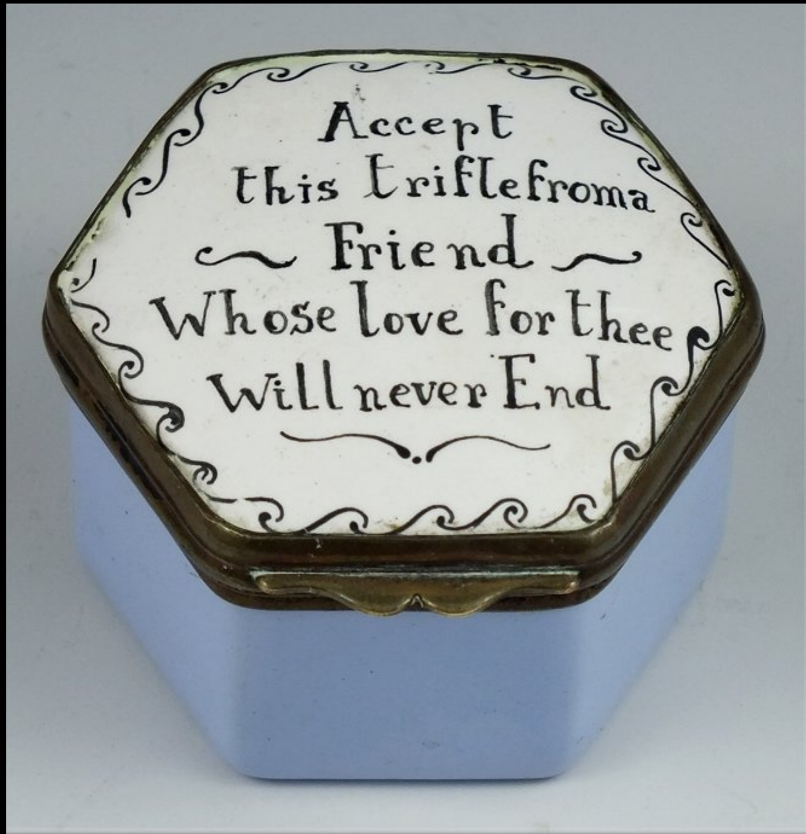
English Bilston Enamel Patch Box