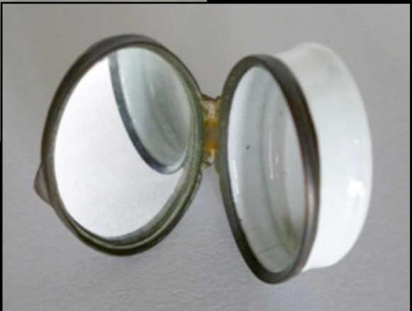
A Bilston Enamel Patch Box c. 1780 (Private Collection)