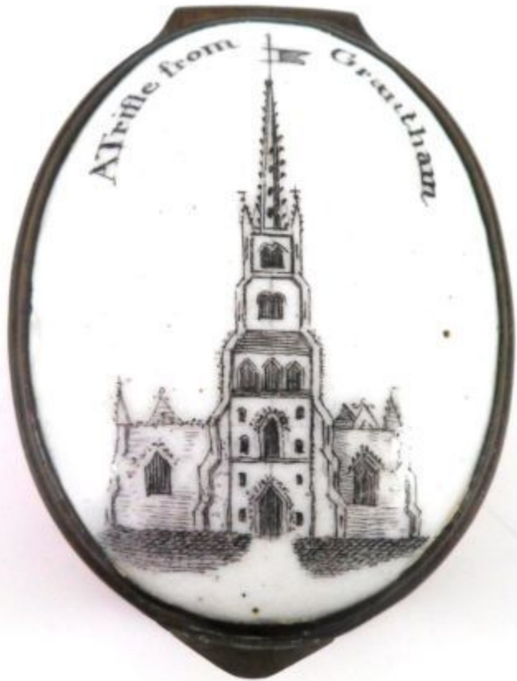
English Bilston Enamel Patch Box