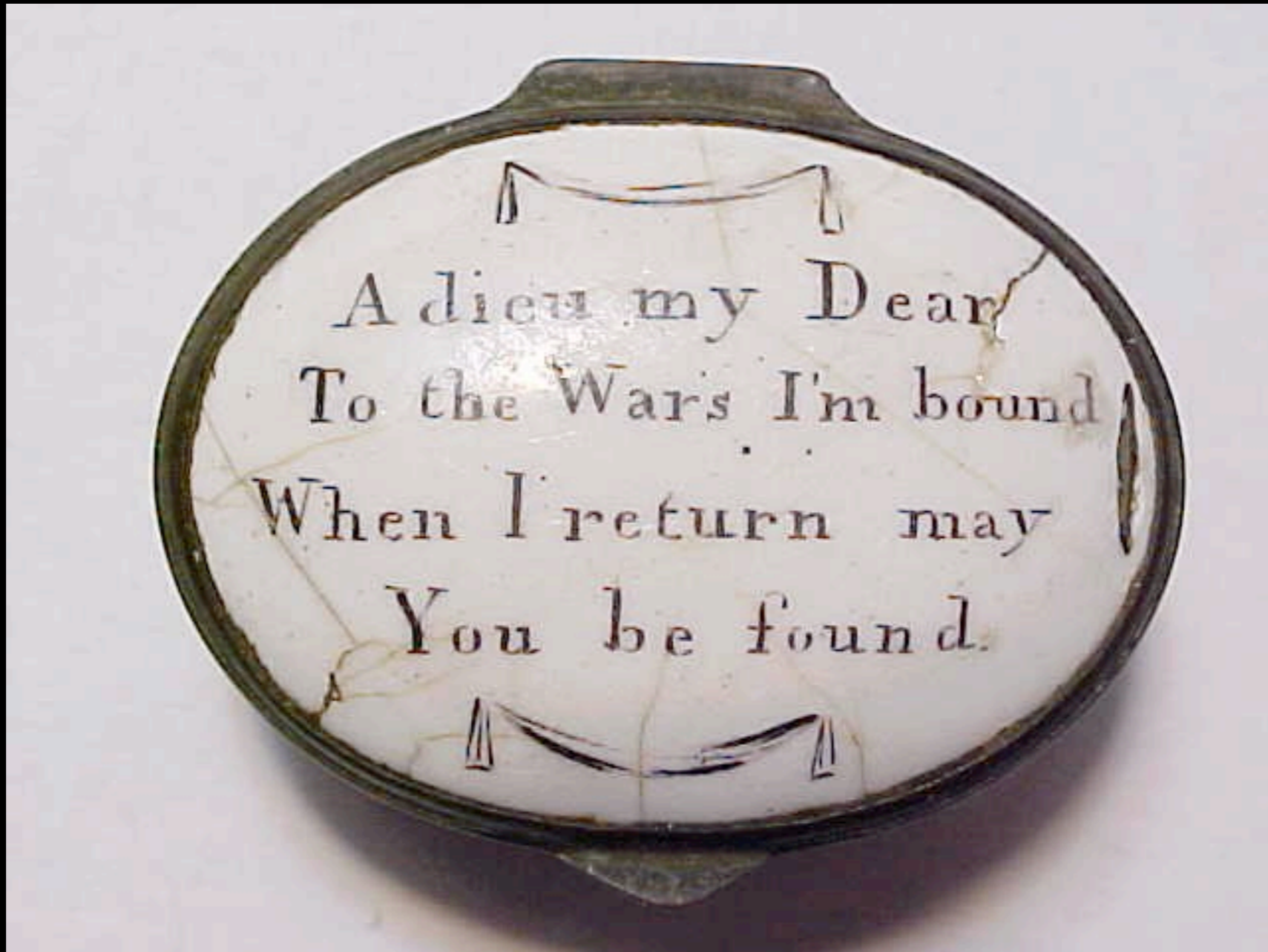
Bilston Enamel Patch Box Given by a British Soldier to His Love c. 1770 - 1780 (Private Collection)