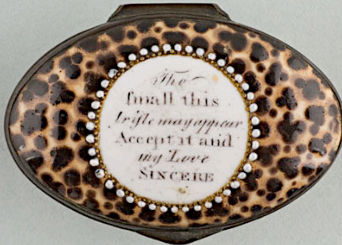
English Enamel Patch Box