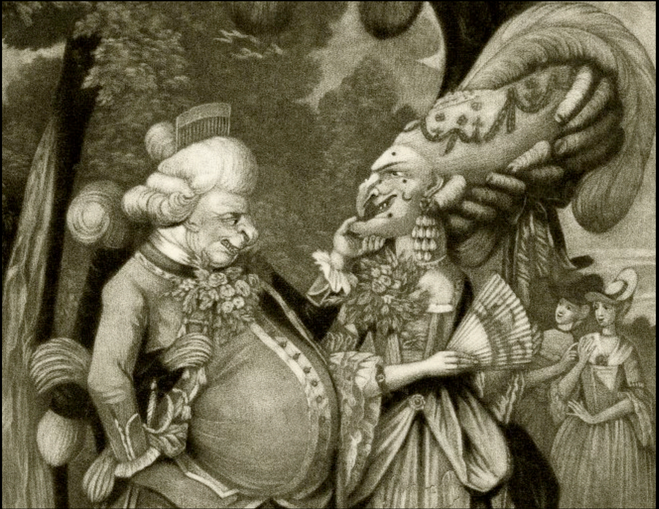
“AGE and FOLLY, or the BEAUTIES.” Published by Sayer & Bennett 1776