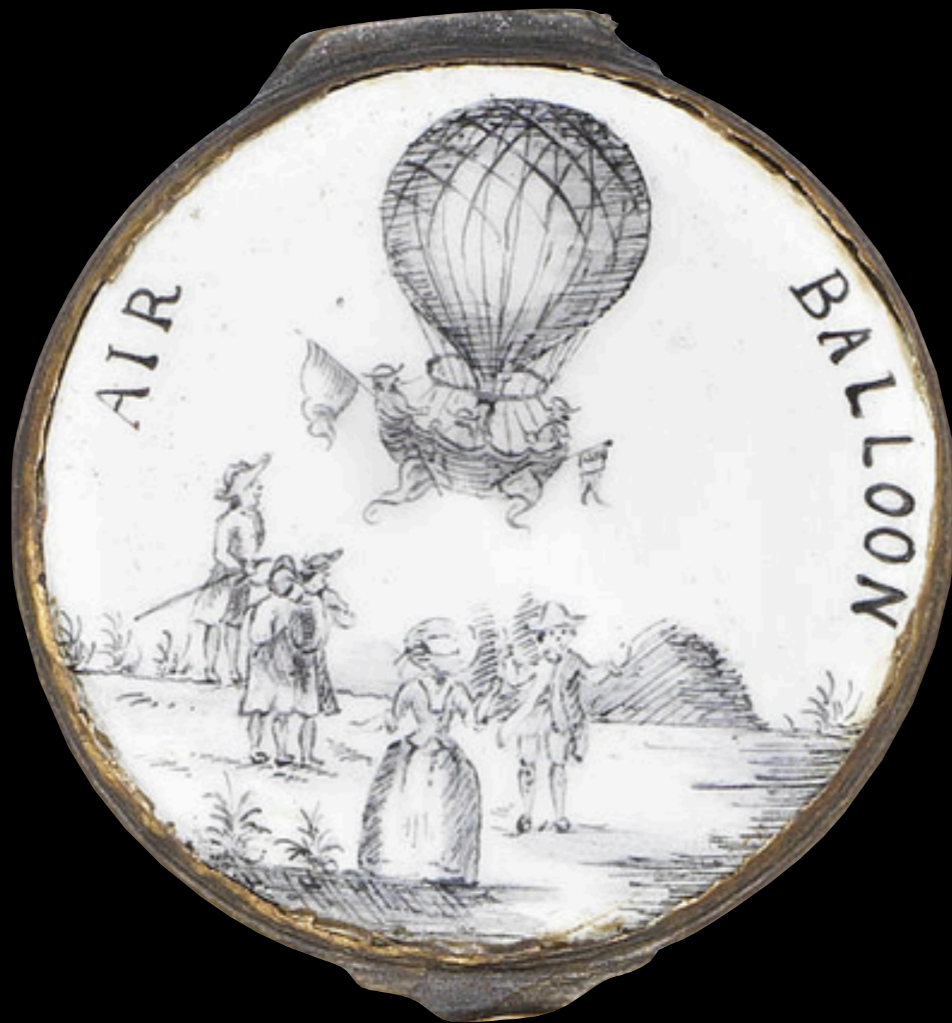
South Staffordshire Enamel Patch Box