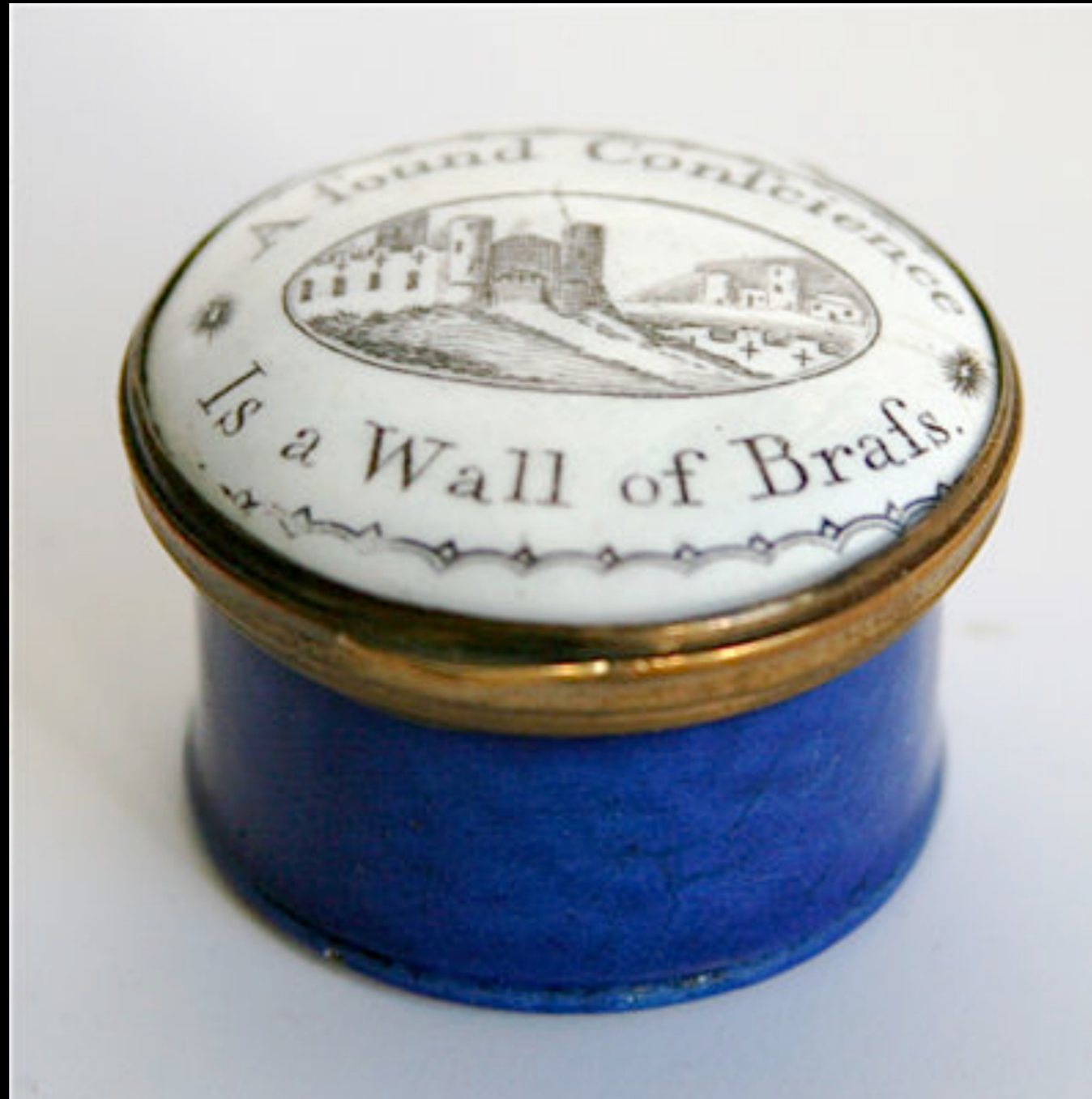
English Enamel Patch Box "A Sound Conscience is a Wall of Brass" Late 18th Century (Walpole Antiques)