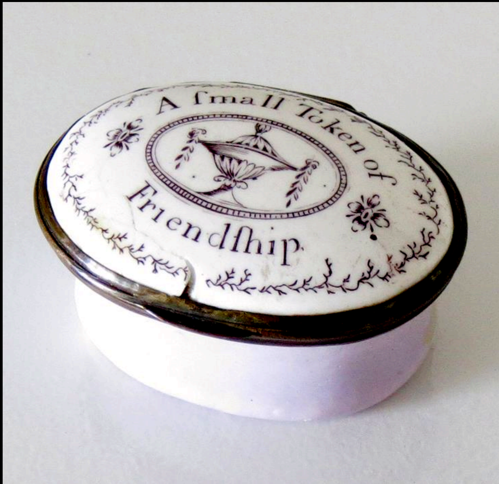
English Battersea Enamel Patch Box c. 1780 (Private Collection)