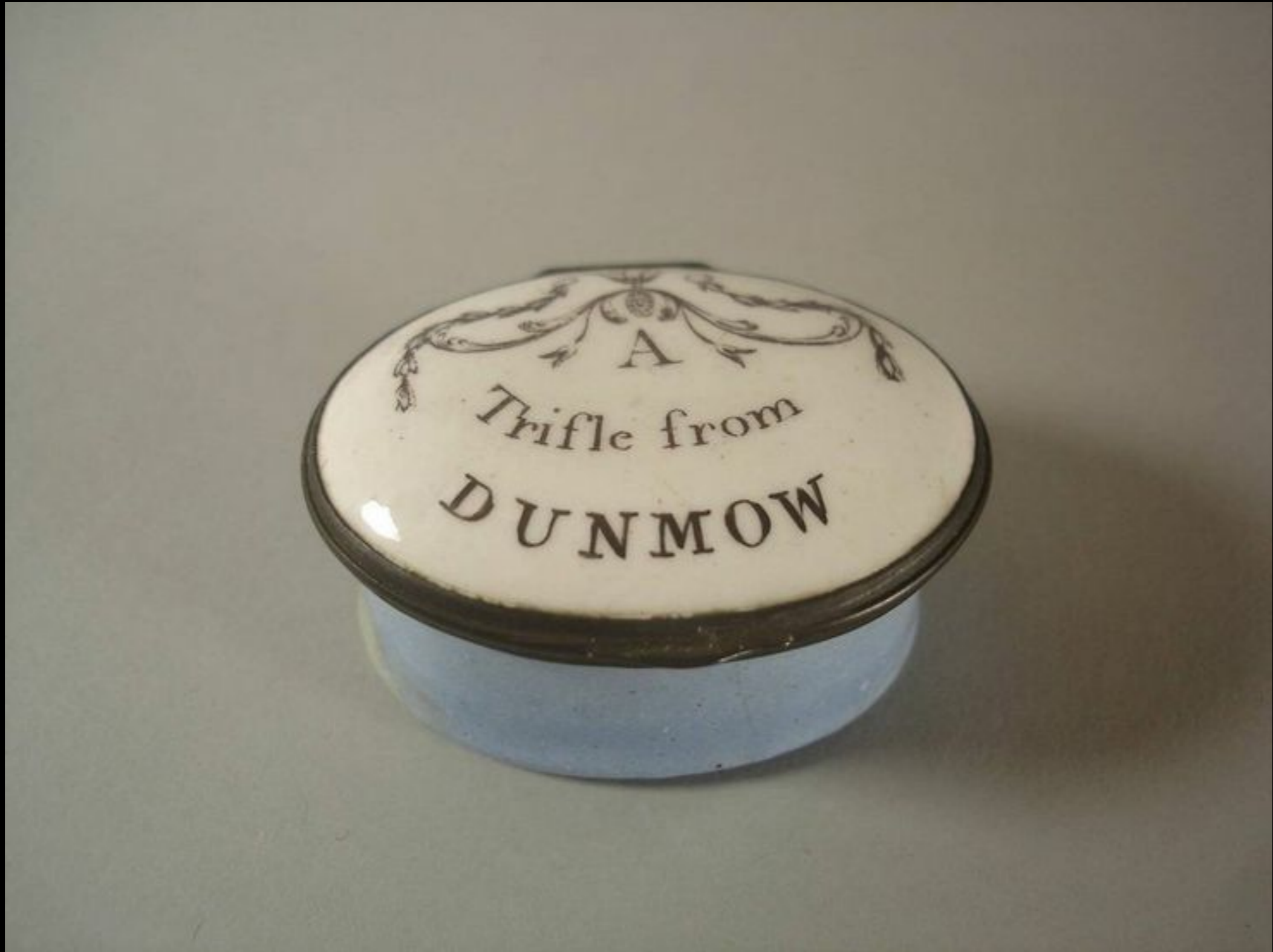
English Bilston Enamel Patch Box c. 1780 (Private Collection)