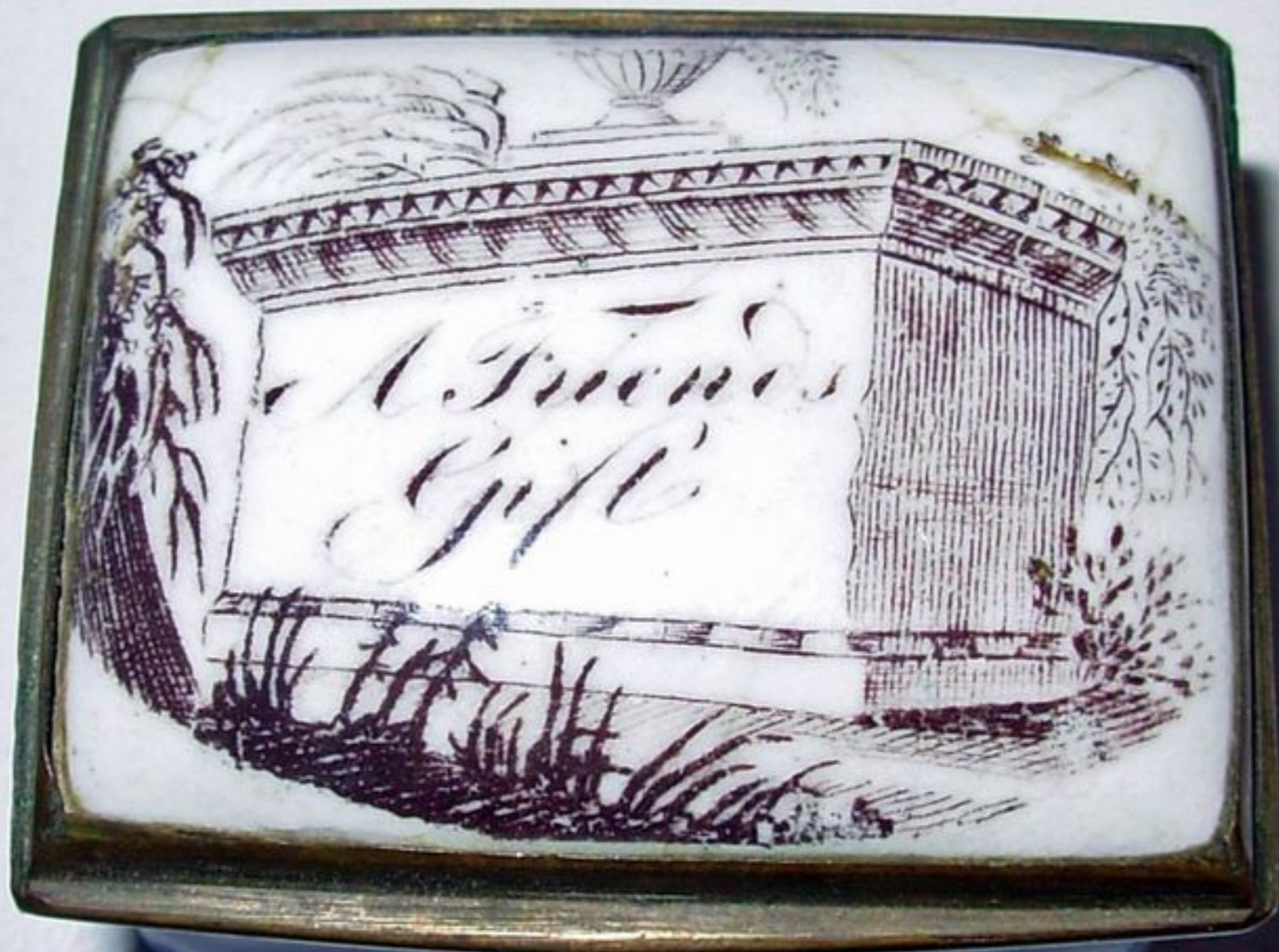
English Enamel Patch Box c. 1780 (Private Collection)