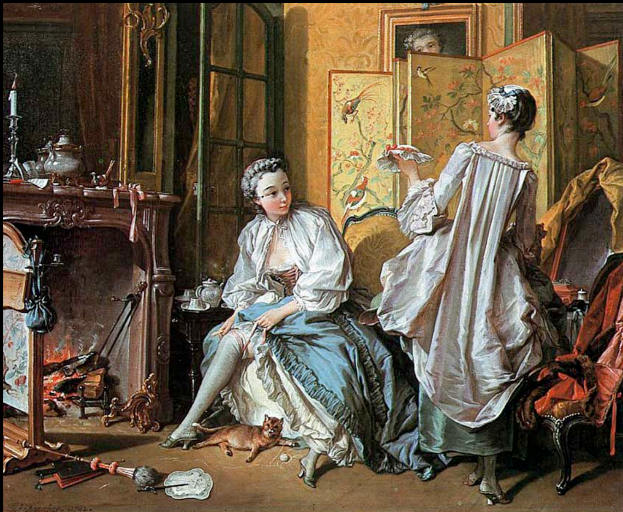
Lady Fastening Her Garter (La Toilette) by François Boucher (Madrid, Spain) 1742 (Museo de arte Thyssen-Bornemisza, Madrid)