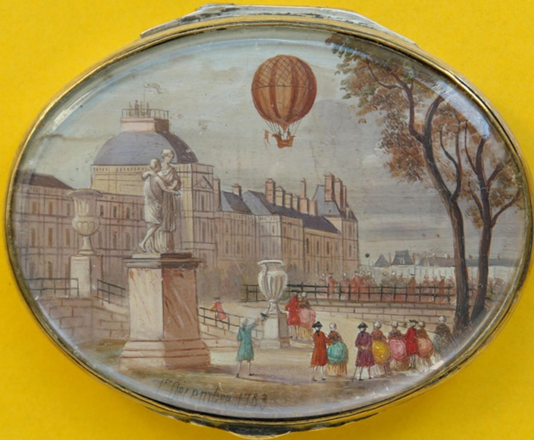
Silvered Copper & Tortoise Patch Box of a Flight by Montgolfier in Front of the Louvre Dated 1 December, 1783 (Artfinding.com)