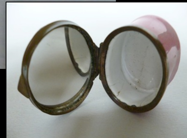
A Bilston Enamel Patch Box c. 1780 (Private Collection)