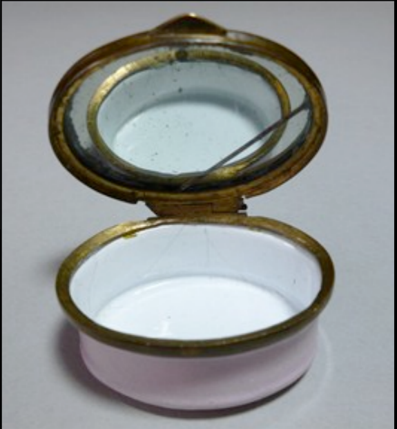
English Enamel Patch Box c. 1780 (Private Collection)