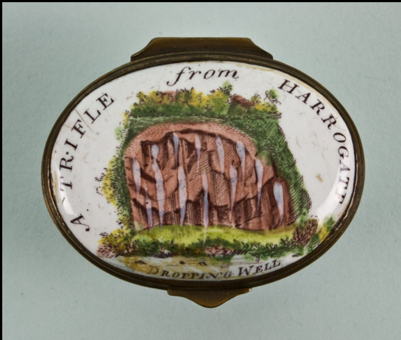
A Bilston Enamel Patch Box c. 1780 (Private Collection)