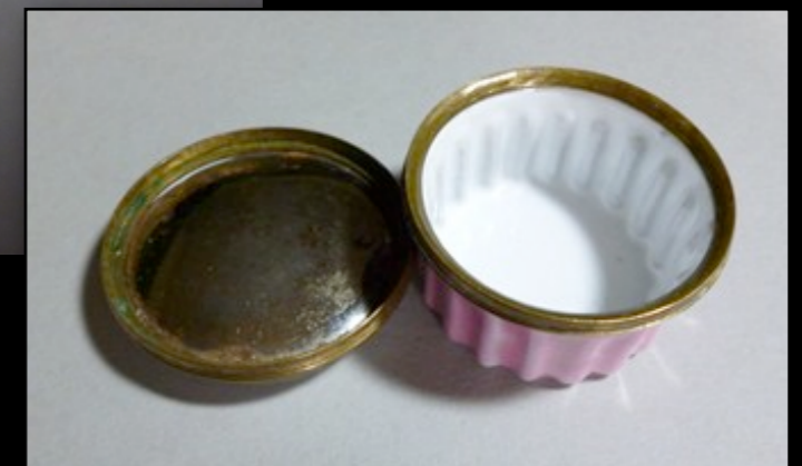
English Enamel Patch Box c. 1780 (Private Collection)