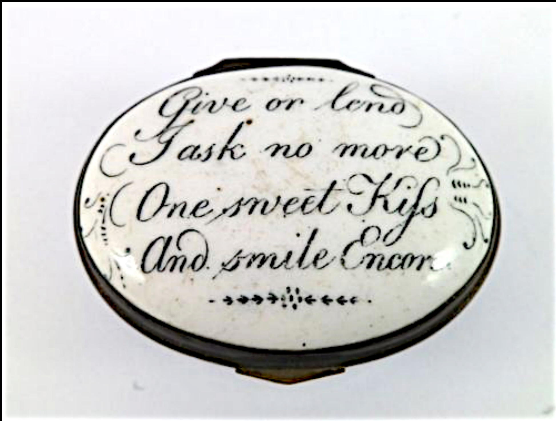
English Bilston or Staffordshire Enamel Patch Box