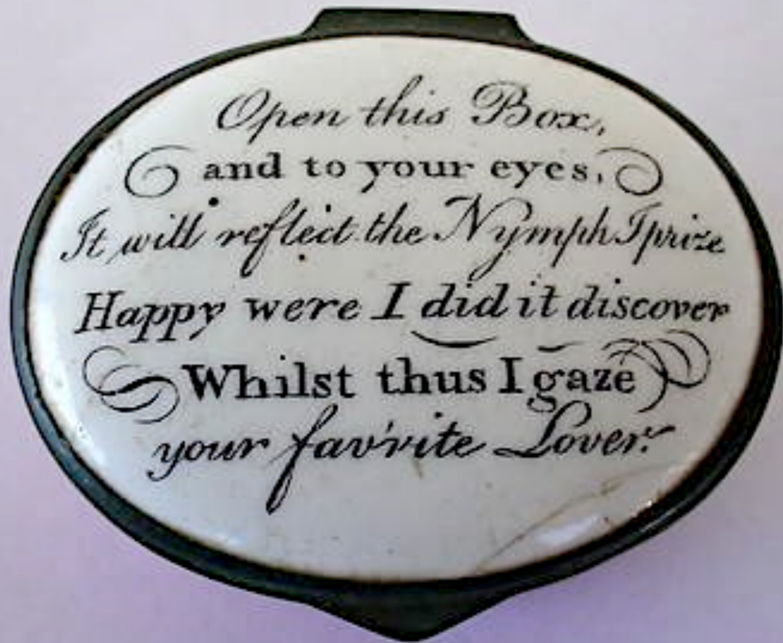
English Bilston Enamel Patch Box