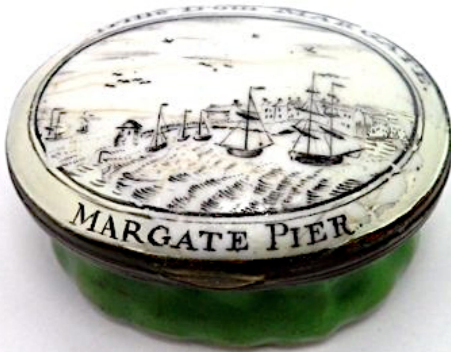
English Bilston Enamel Patch Box c. 1780 (Private Collection)