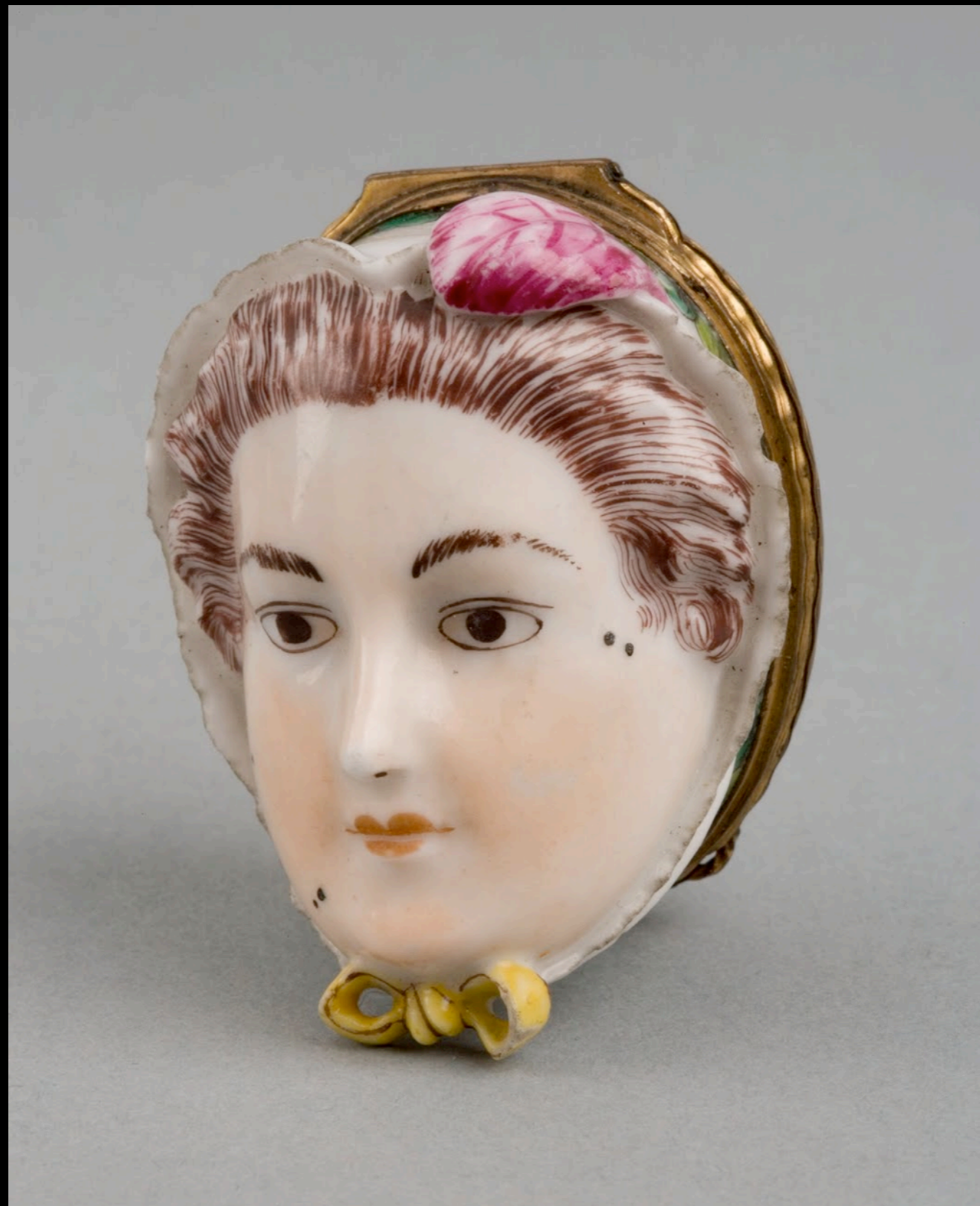
English Enamel Patch Box from Charles Gouyn's Factory, London