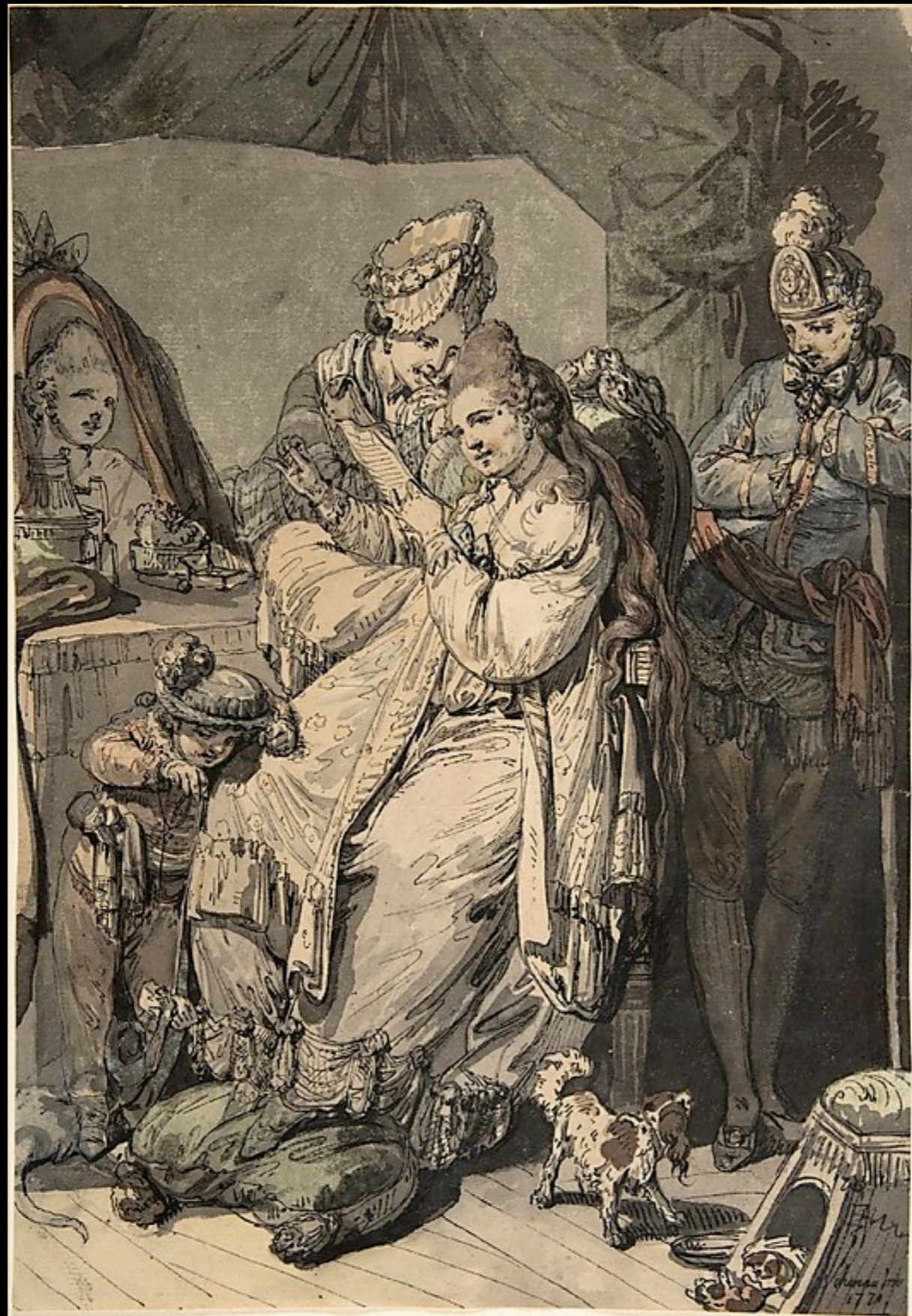
“A Woman at Her Toilet” by Johann Eleazar Schenau 1720 (Metropolitan Museum of Art)