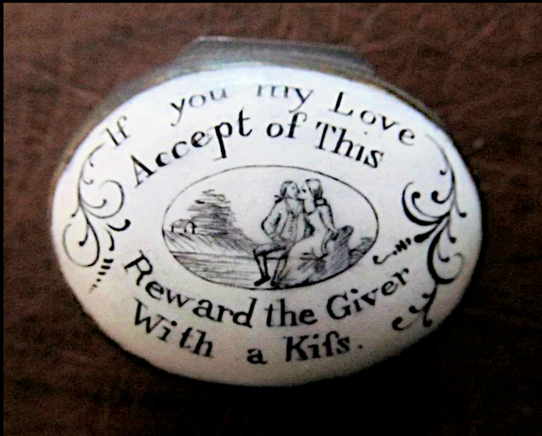
English Enamel Patch Box