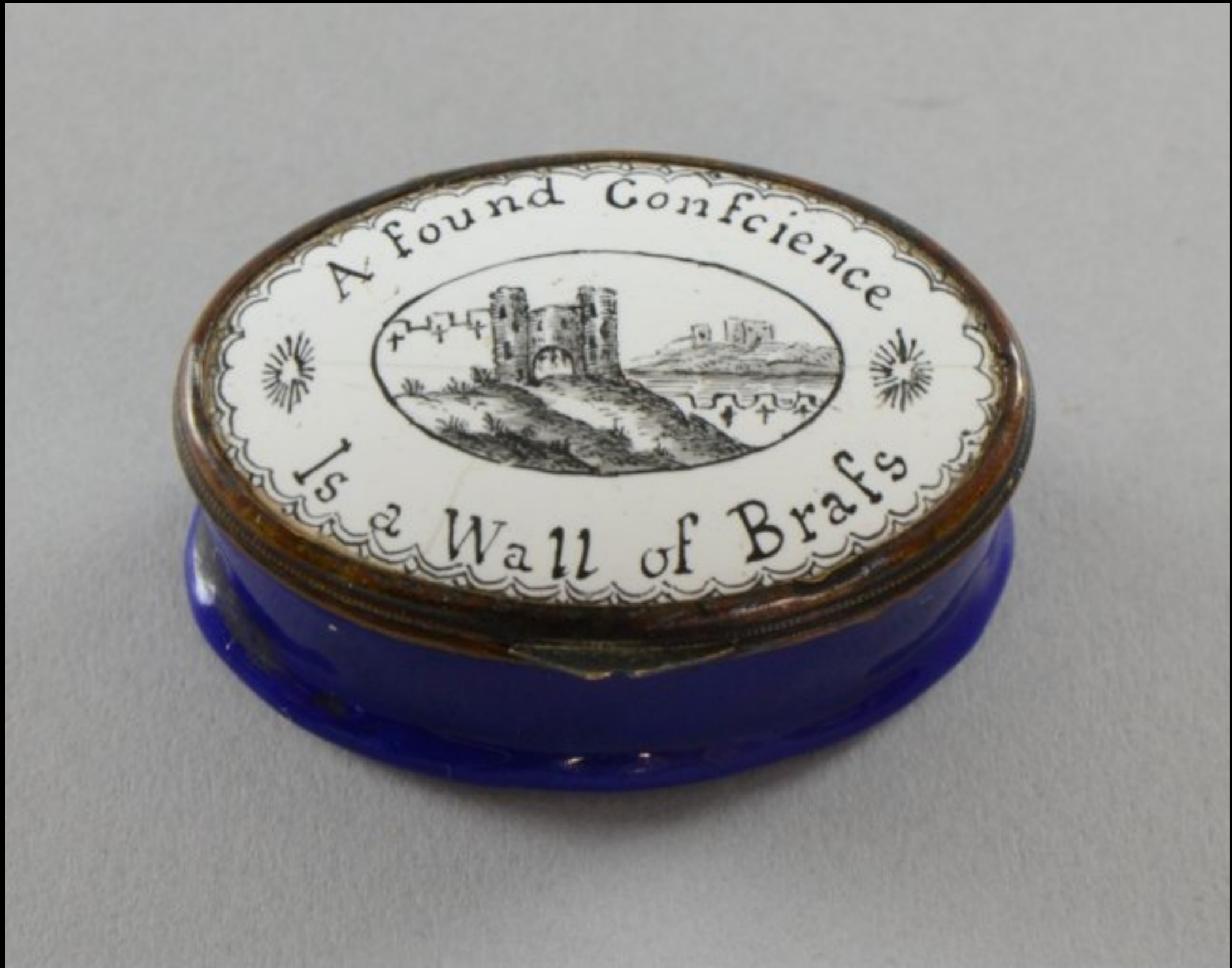
English Bilston Enamel Patch Box c. 1780 (Private Collection)