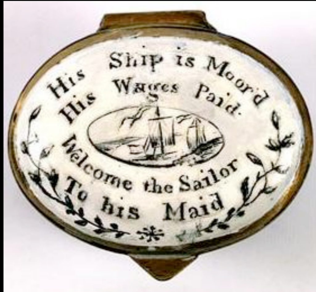
Bilston Enamel Patch Box Given by a British Sailor to His Love c. 1780