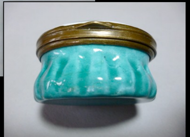
English Enamel Patch Box c. 1780 (Private Collection)