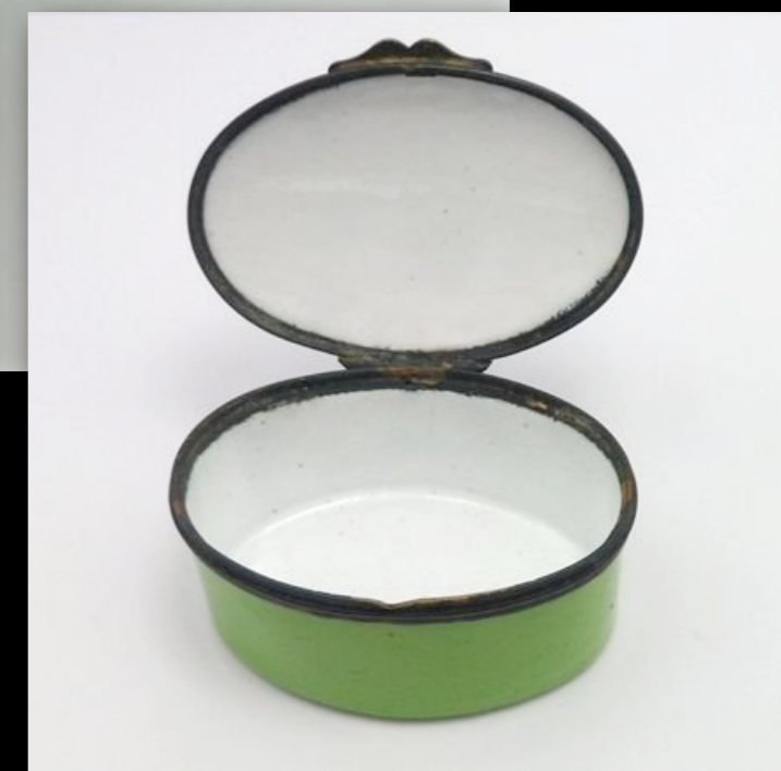
English Enamel Patch Box c. 1780 (Private Collection)