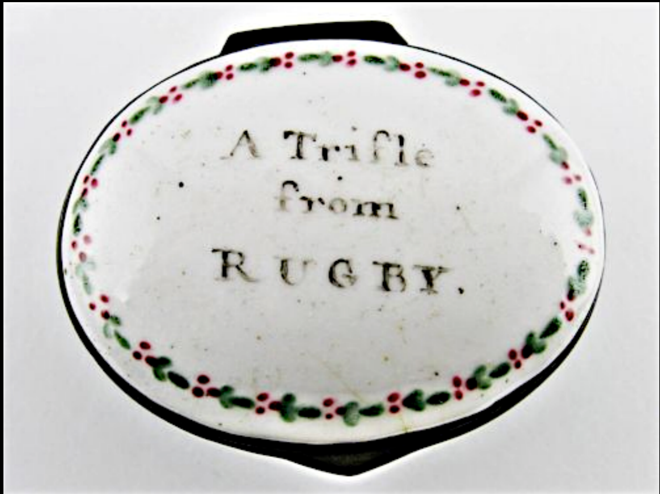
English Bilston or Battersea Enamel Patch Box c. 1780 (Private Collection)