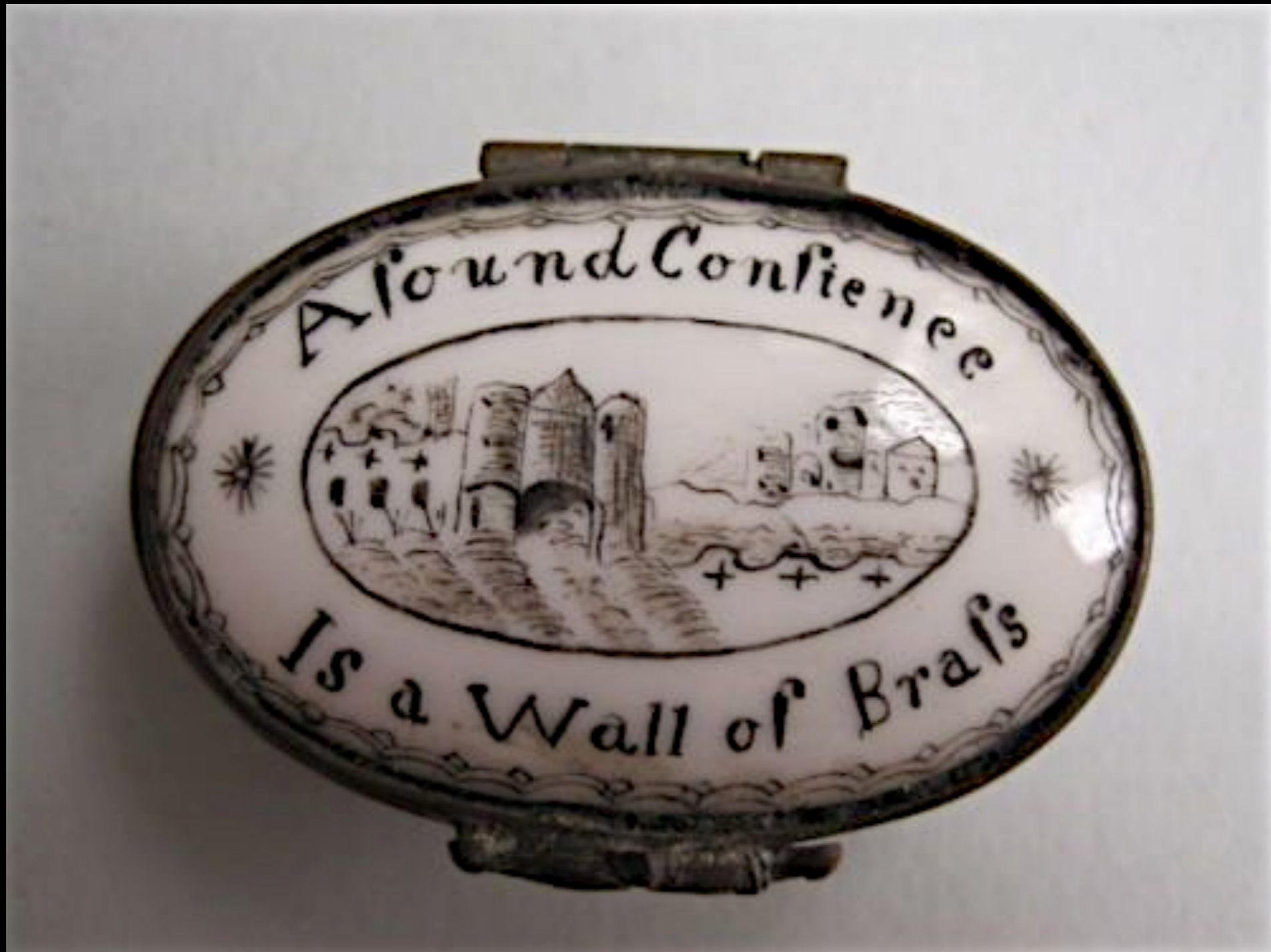
English Bilston Enamel Patch Box c. 1780 (Private Collection)