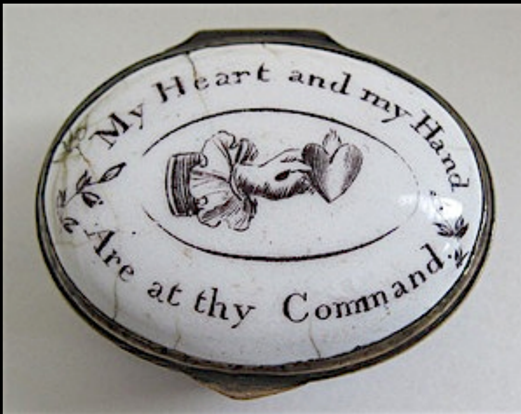
English Bilston or Battersea Enamel Patch Box