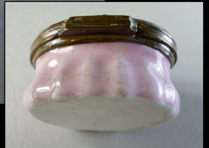
A Bilston Enamel Patch Box c. 1780 (Private Collection)