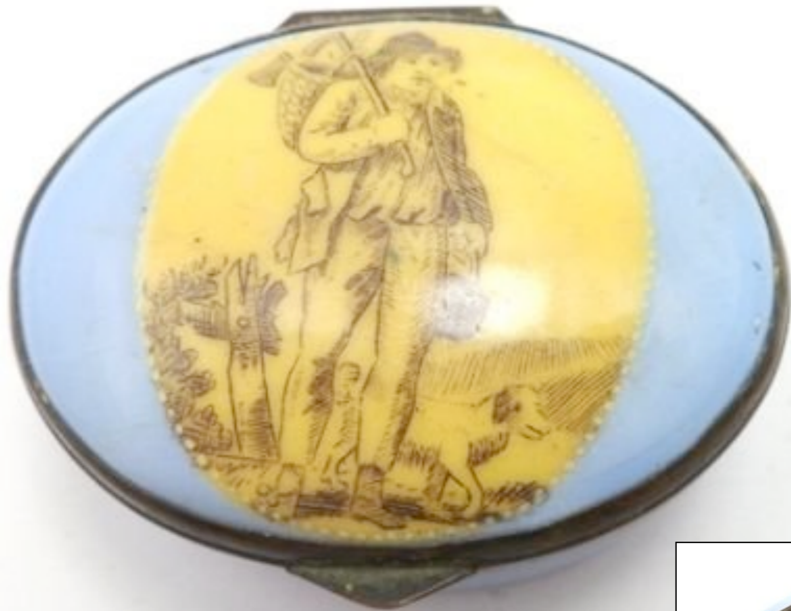
A Bilston Enamel Patch Box c. 1780 (Private Collection)