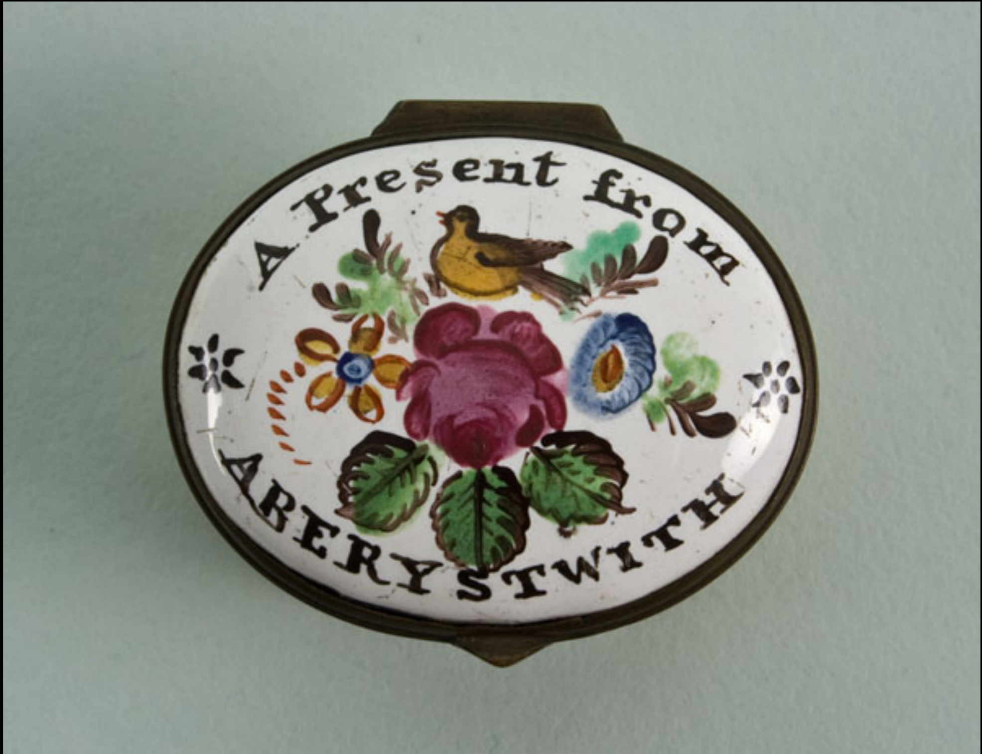
English Enamel Patch Box c. 1780 (Private Collection)