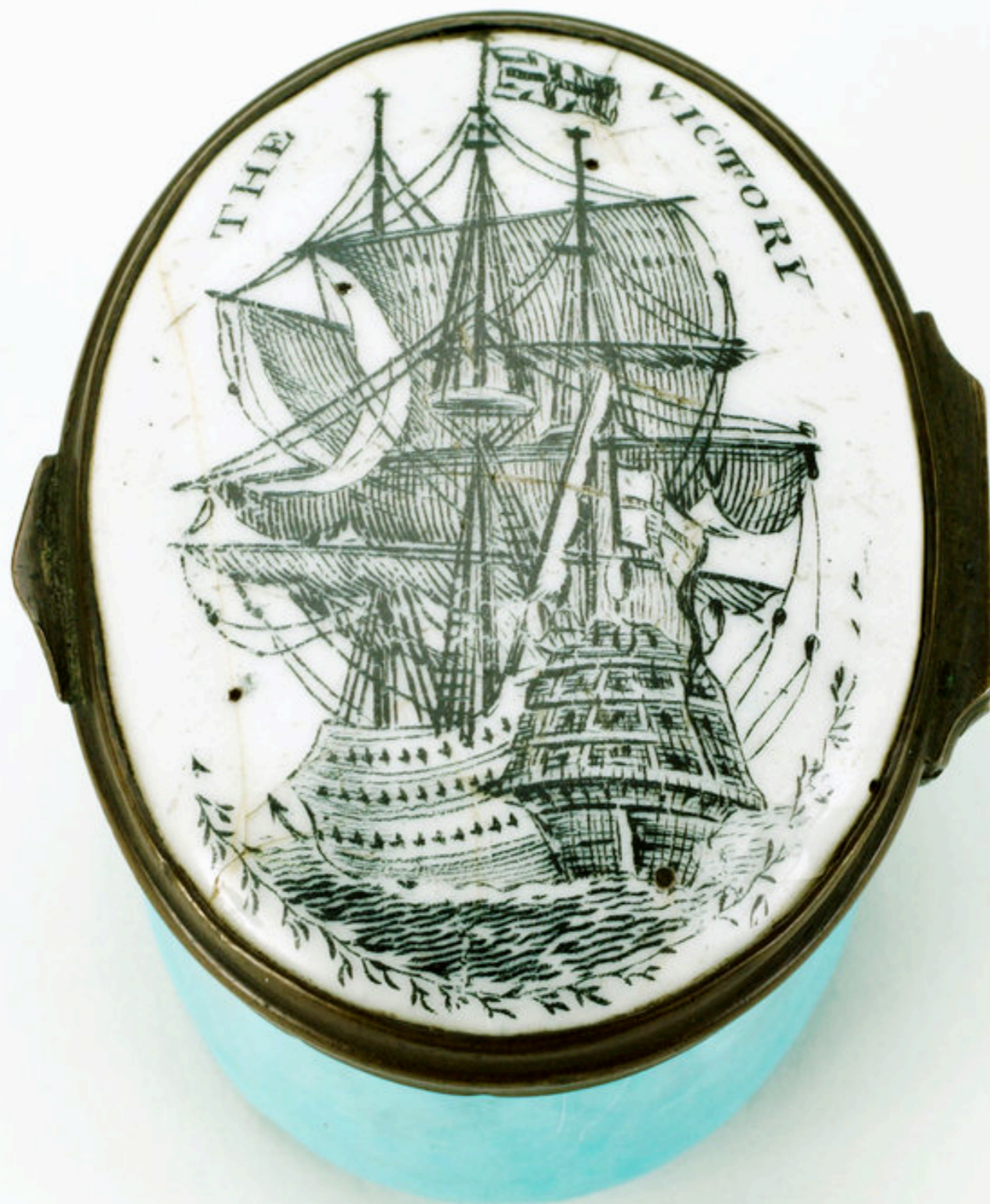
English Enamel Patch Box "The Victory" c. 1780 (National Maritime Museum)