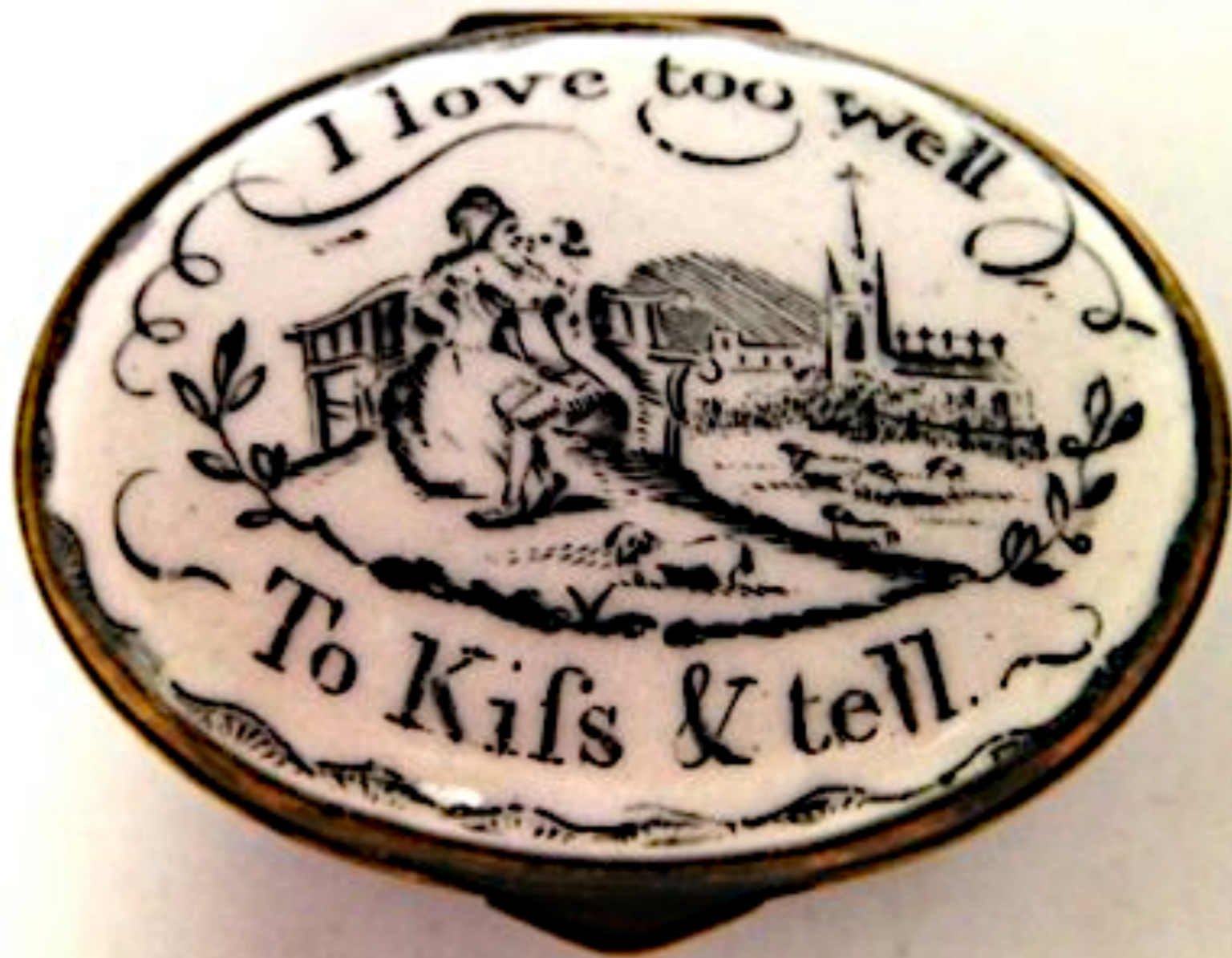
English South Staffordshire Bilston Enamel Patch Box