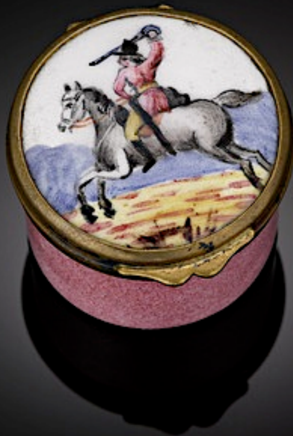
English Enamel Patch Box c. 1780 (Private Collection)