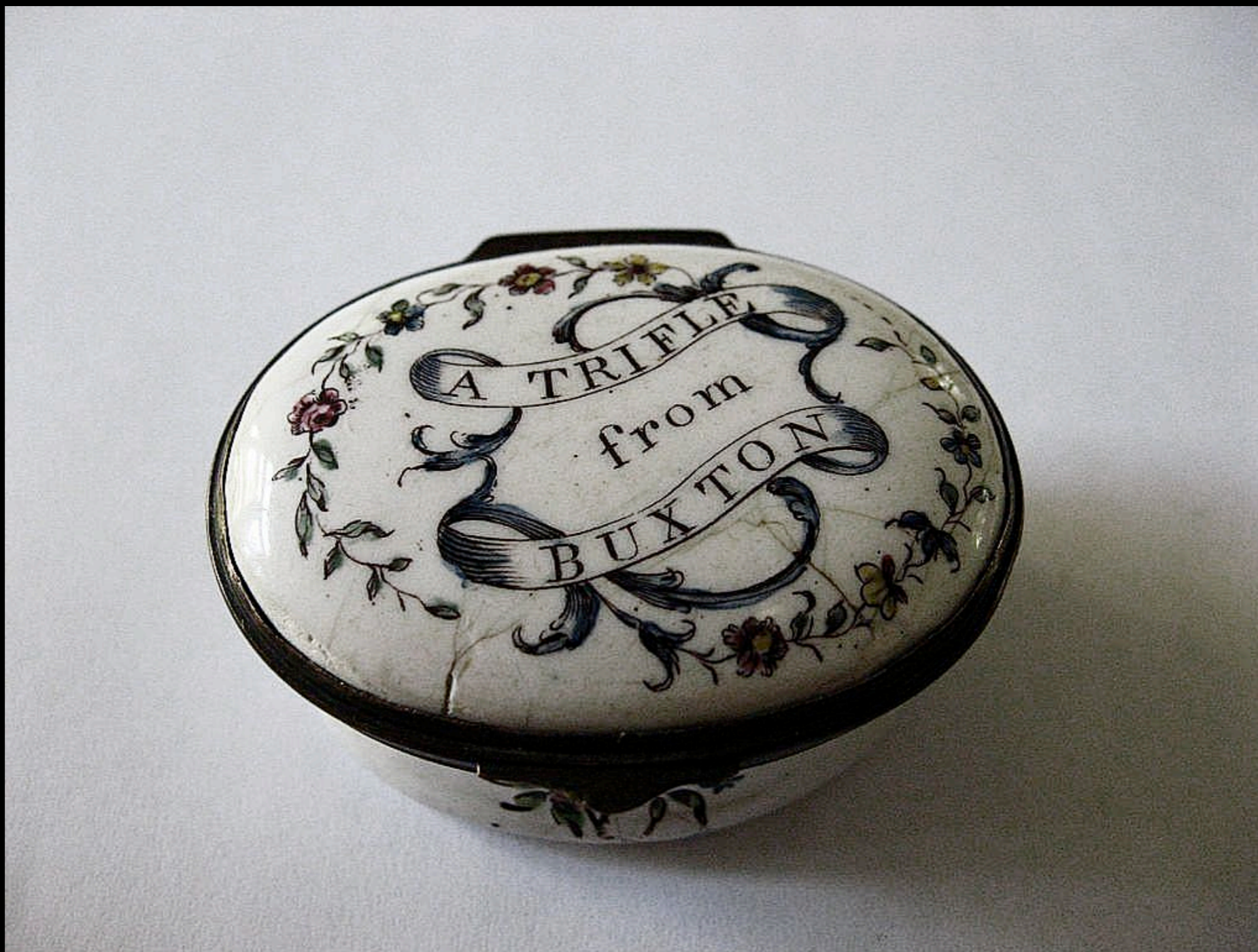
English Enamel Patch Box