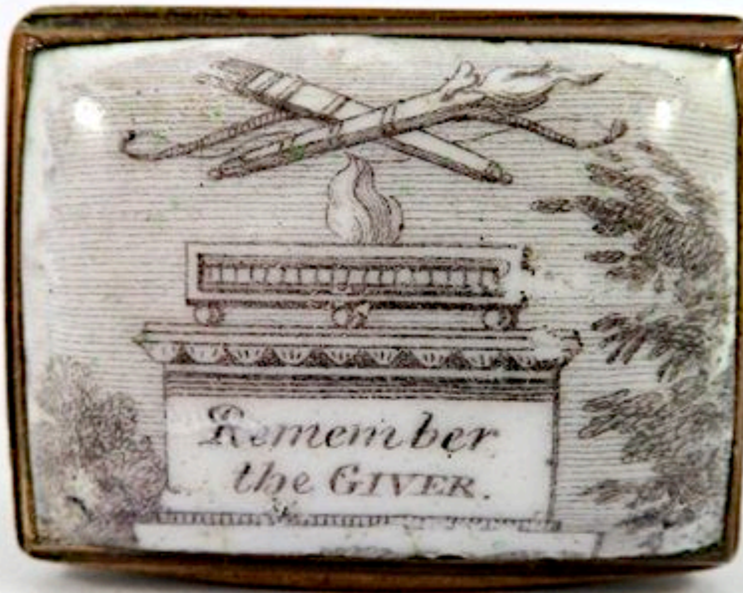
English Enamel Patch Box c. 1780 (Private Collection)