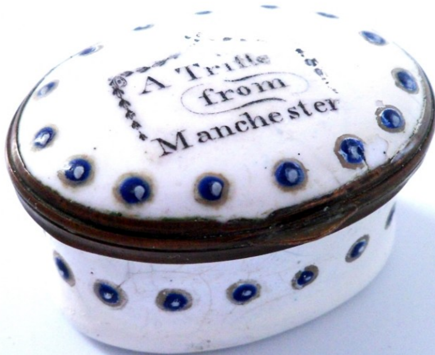
English Bilston Enamel Patch Box c. 1780 (Private Collection)