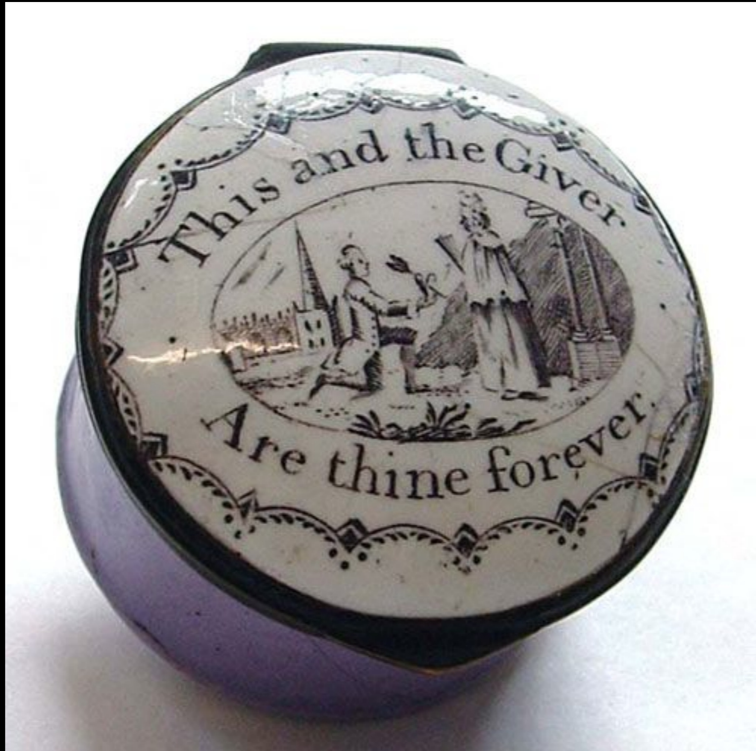
English Enamel Patch Box from Bilston c. 1780 (The History of Wolverhampton)