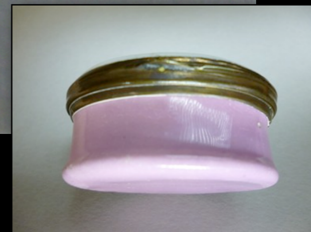
English Enamel Patch Box c. 1780 (Private Collection)