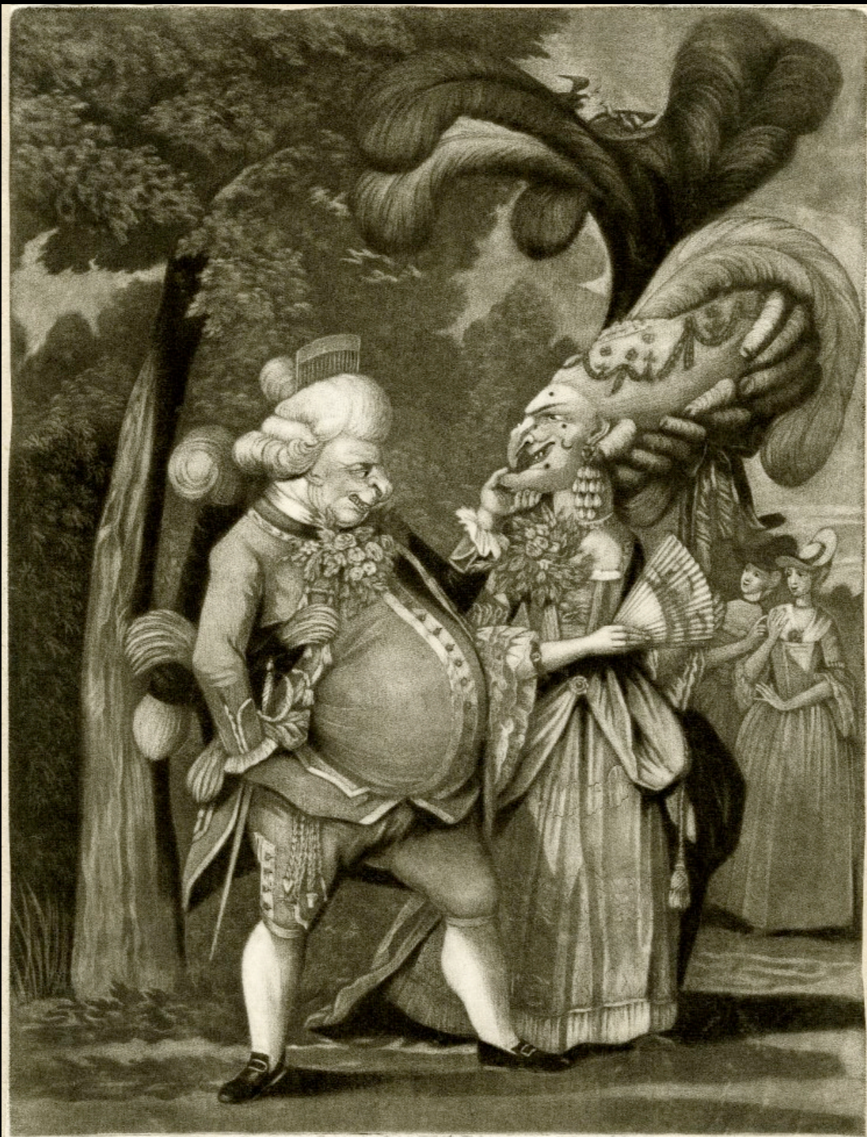
AGE and FOLLY, or the BEAUTIES. Search Court and City, Town and Country round. Two such Beauties scarce are to be found.

London. Printed for R. Sayer & J. Bennett, N o . 53, Fleet-Street.