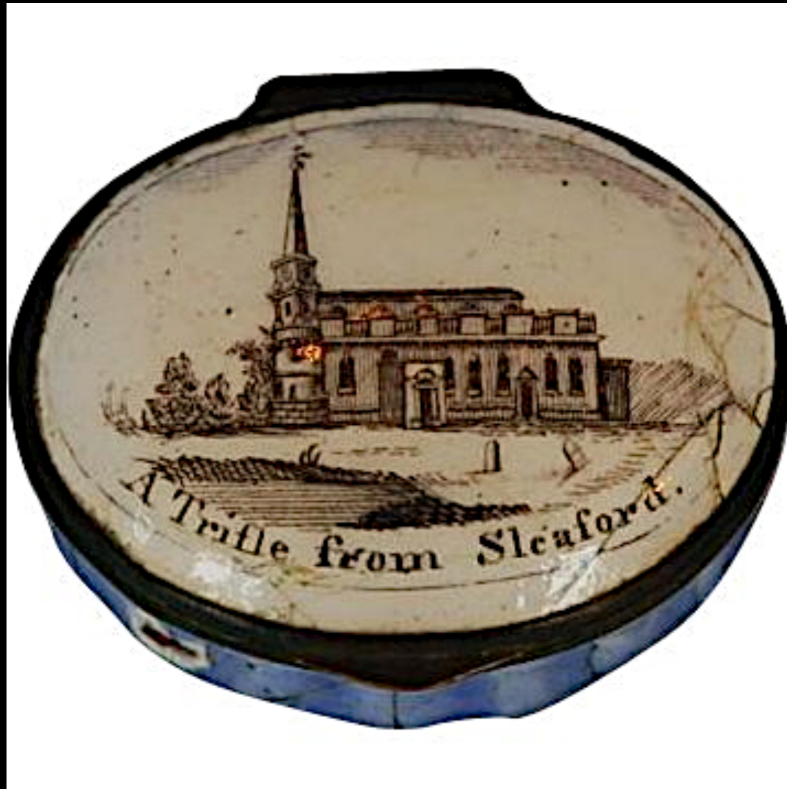
English Bilston or Battersea Enamel Patch Box c. 1780 (Ruby Lane)