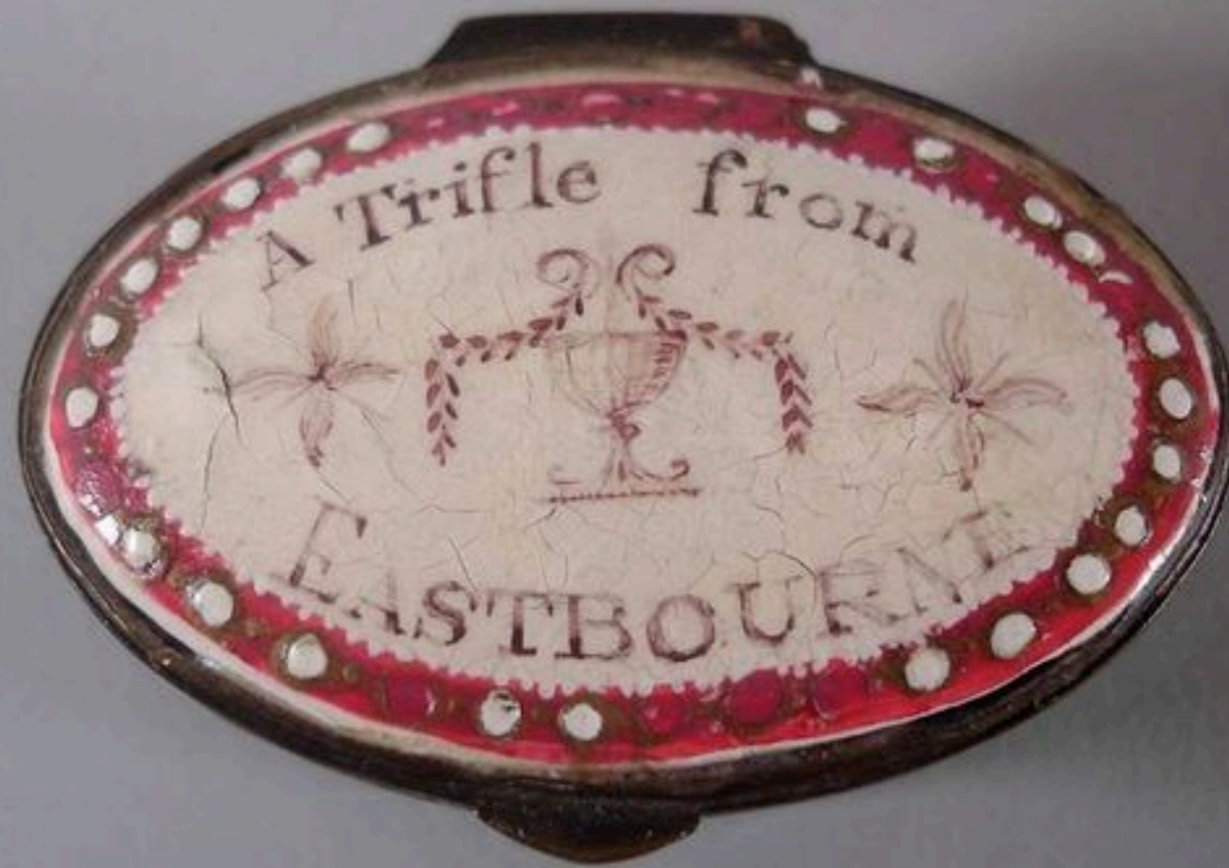
English Bilston Enamel Patch Box c. 1780 (Private Collection)