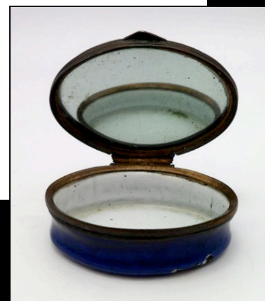
English Bilston Enamel Patch Box c. 1780 (Private Collection)