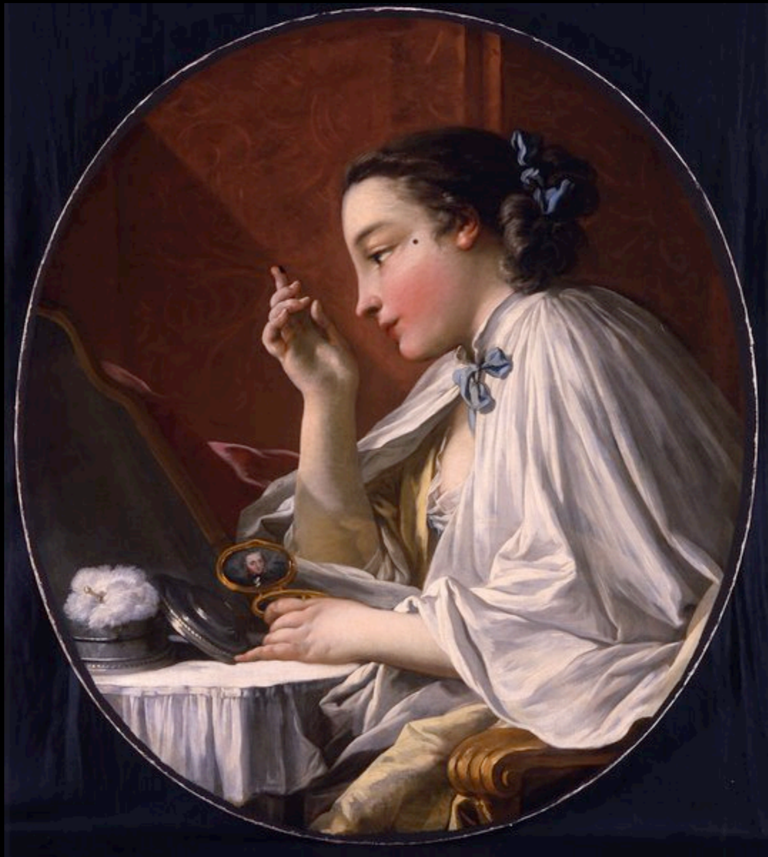
“Une Dame à sa Toilette” by François Boucher (Berheimer-Colnaghi, Munich, London)