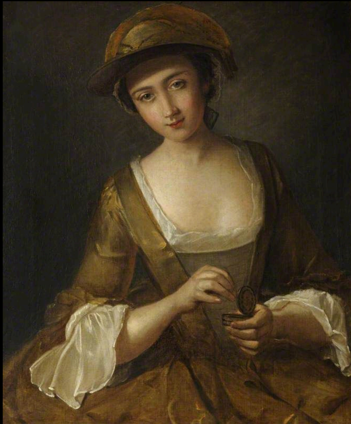
Girl with a Patch Box by Philippe Mercier 1760