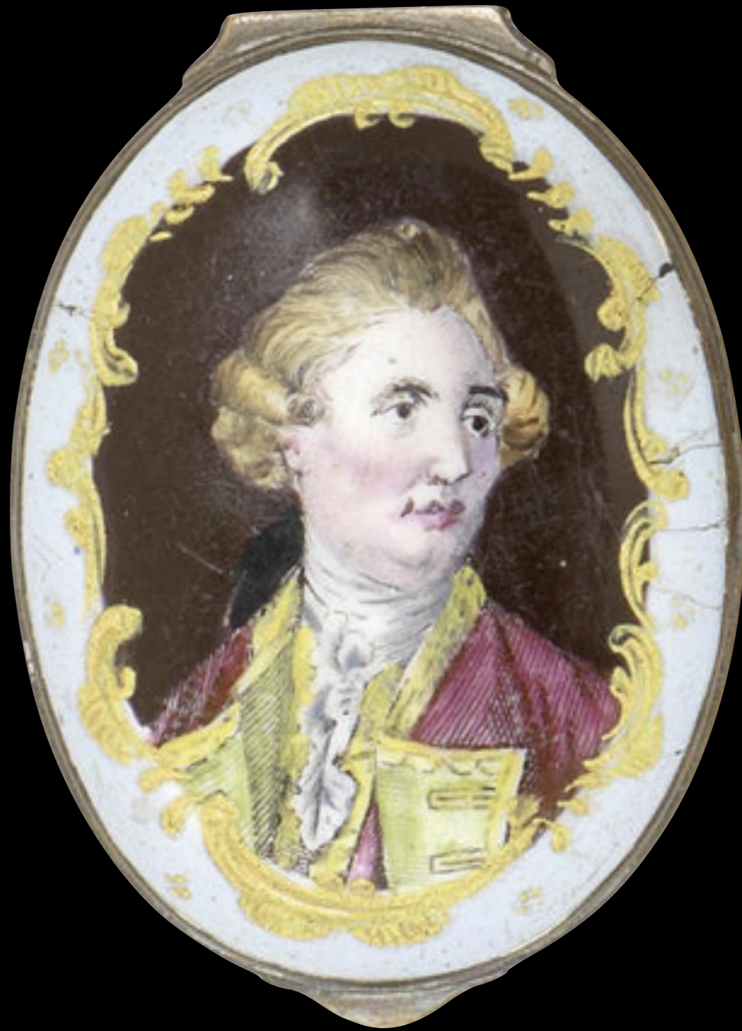
South Staffordshire Admiral Keppel Enamel Patch Box