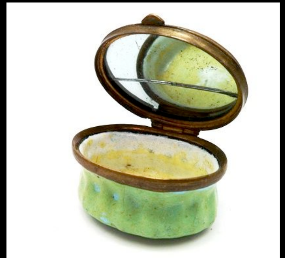
Bilston Enamel Patch Box Weymouth, South Staffordshire c. 1785 (Blackwood Antiques)