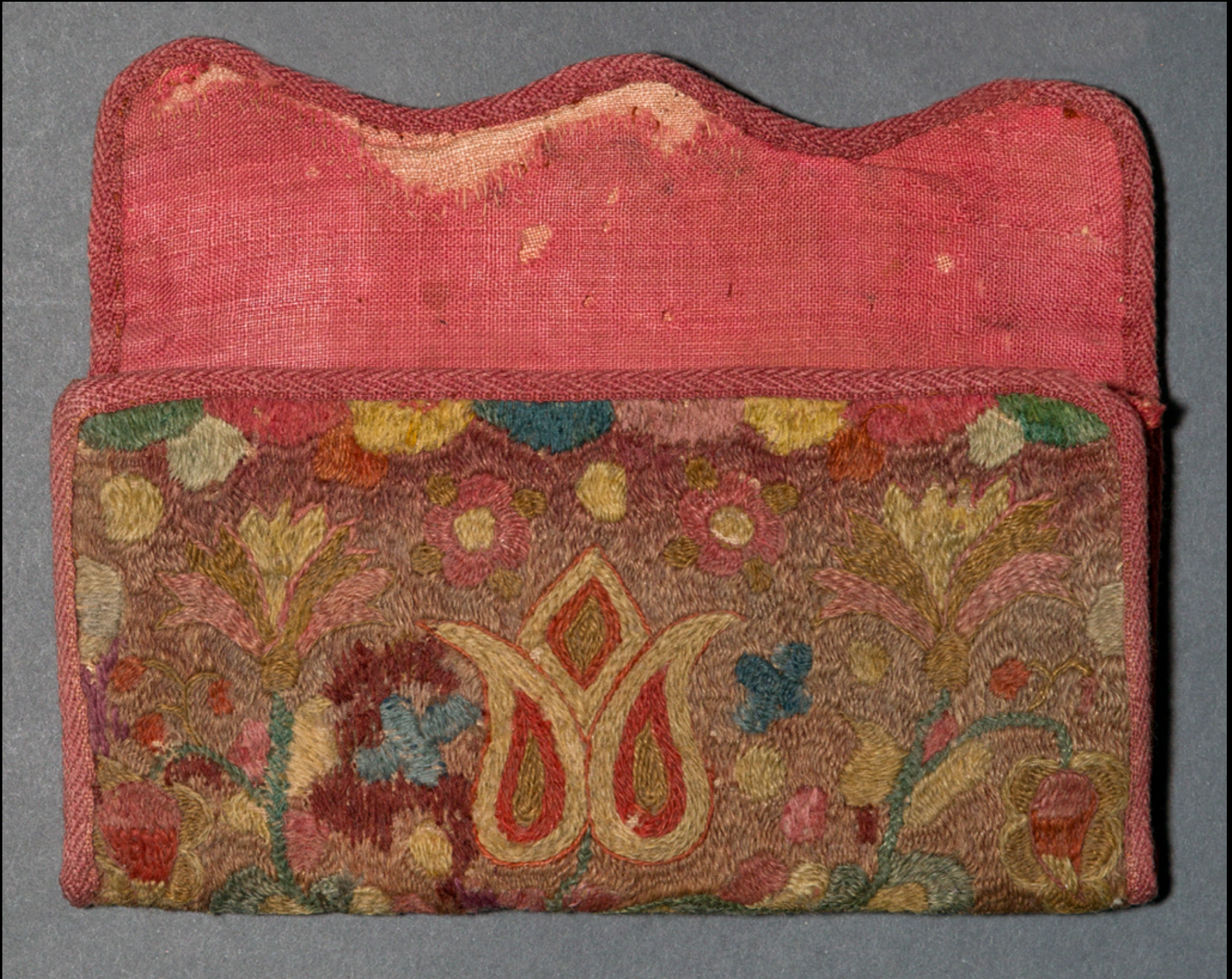
American Wool Embroidered Pocket Book c. 1740 - 1780 (Winterthur)