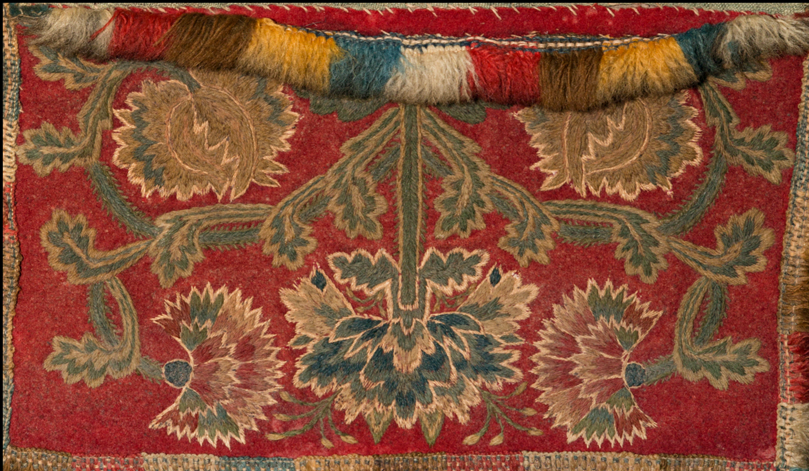
English Wool Embroidered Pocket Book