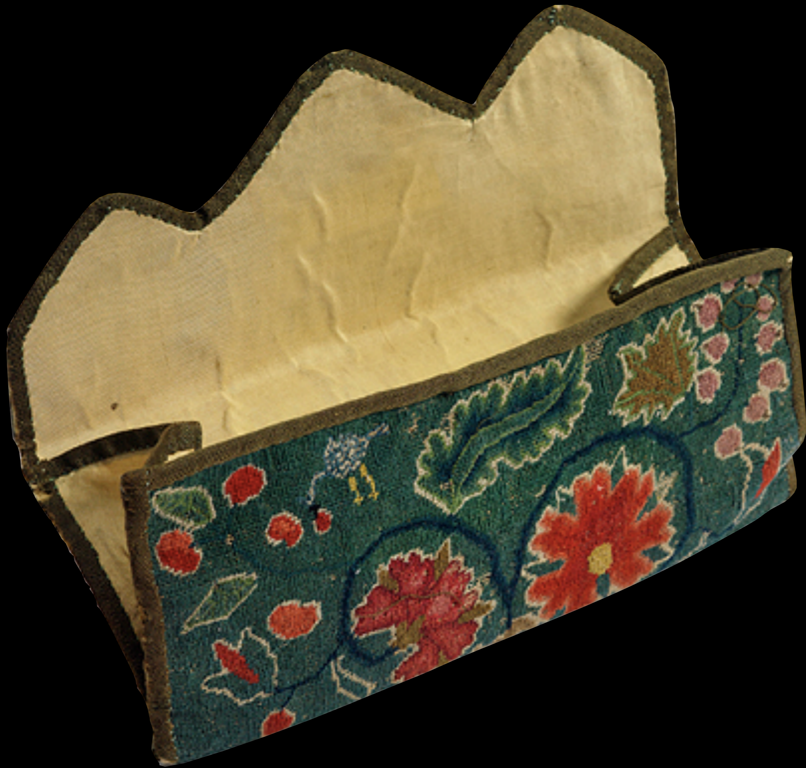
American Wool Embroidered Pocket Book from Connecticut 2nd Half 18th Century (Jan Whitlock Antiques)