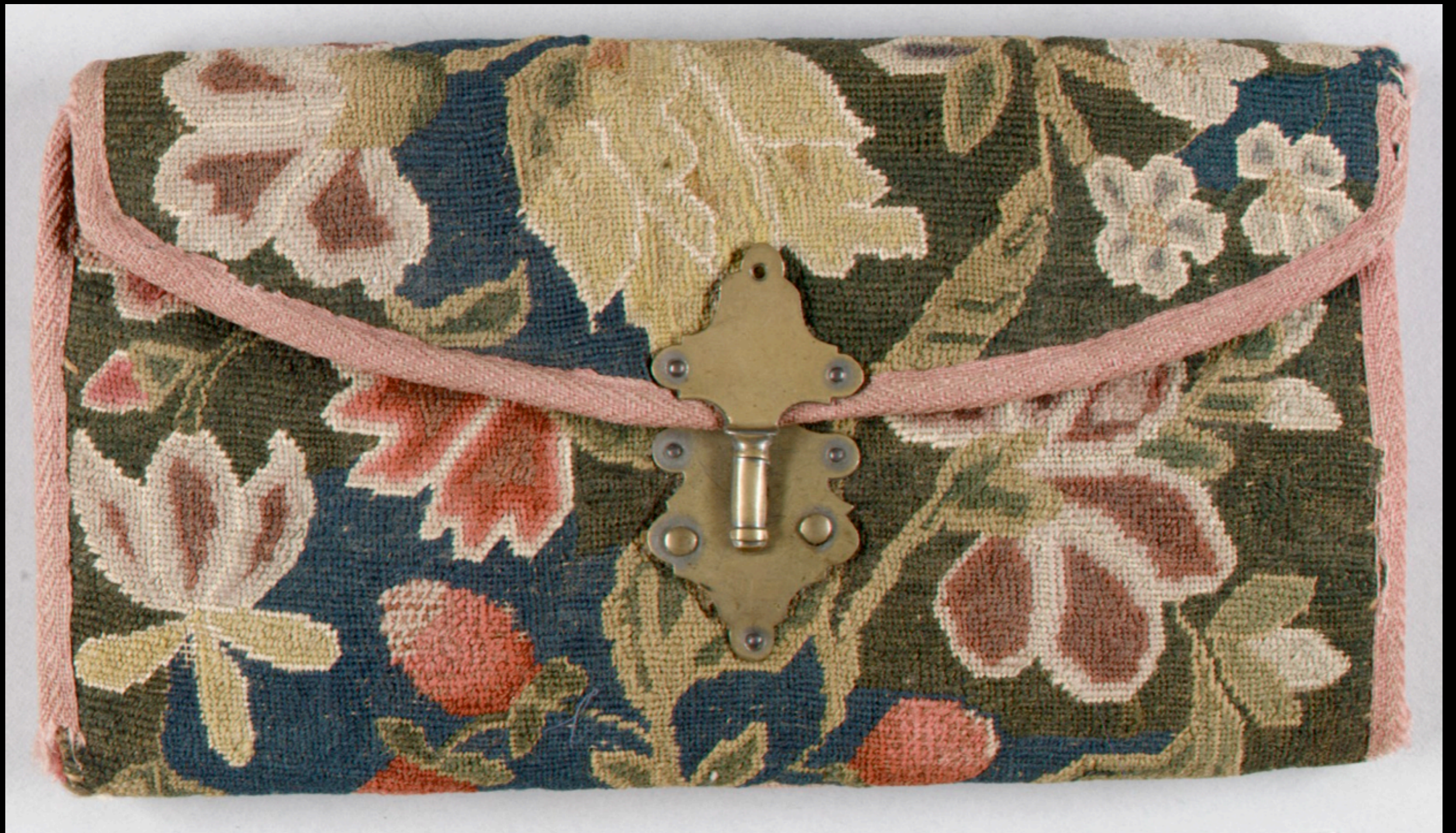
New England Wool Embroidered Pocket Book c. 1760 (Metropolitan Museum of Art)