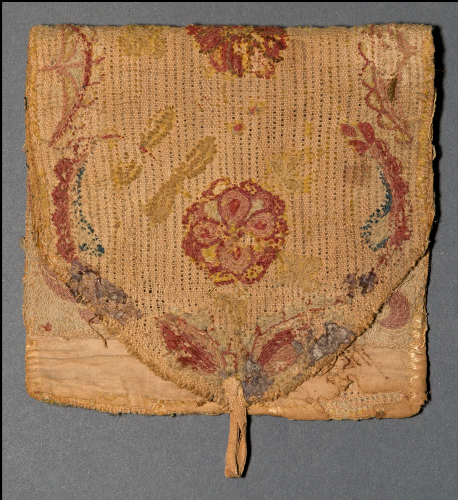
American Wool & Silk Embroidered Pocket Book