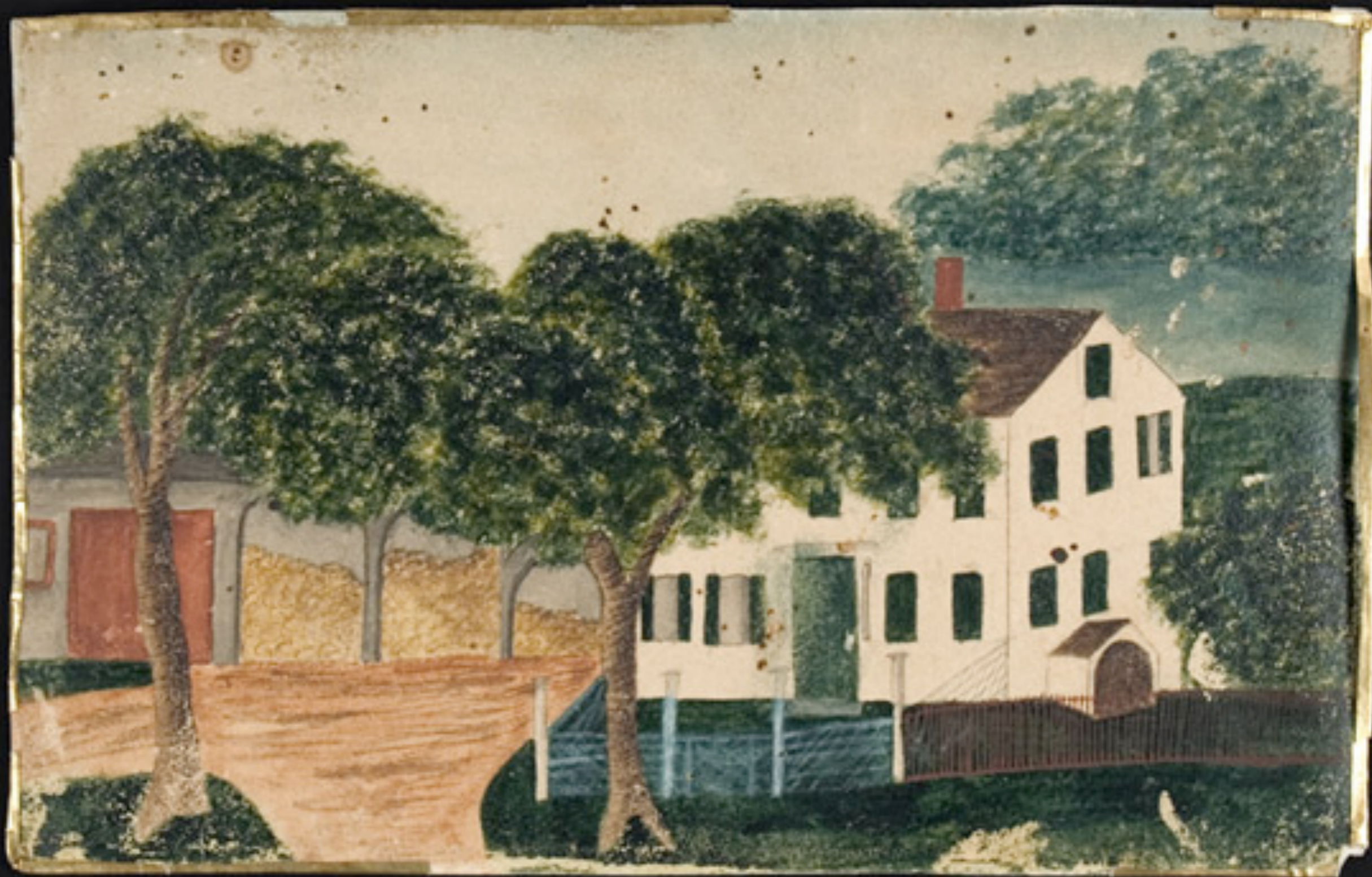
American Wool Embroidered Pocket Book from Townsend, Massachusetts Homestead Watercolor - 2nd Half 18th Century (Antiques Associates at West Townsend, Inc.)