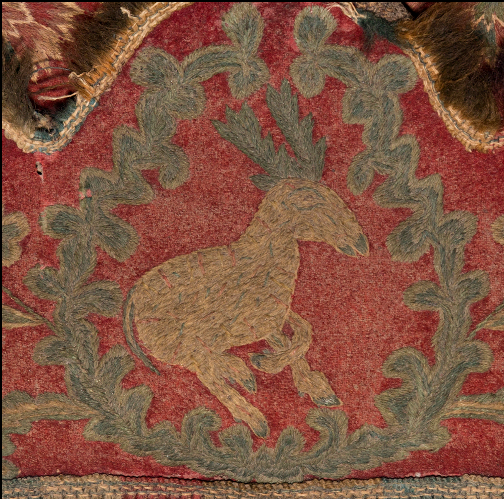
English Wool Embroidered Pocket Book