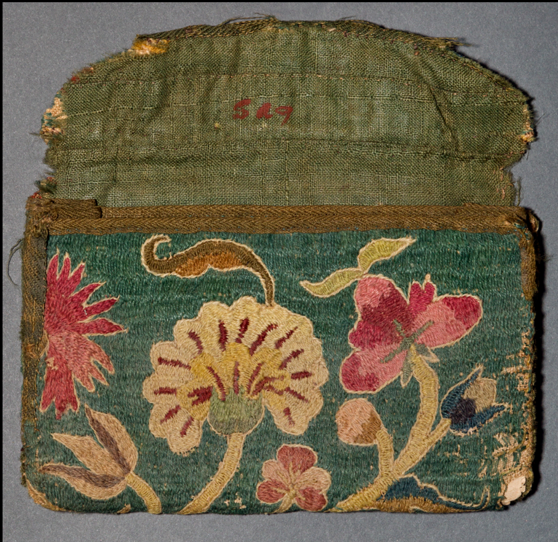
American Wool Embroidered Pocket Book c. 1740 - 1780 (Winterthur)