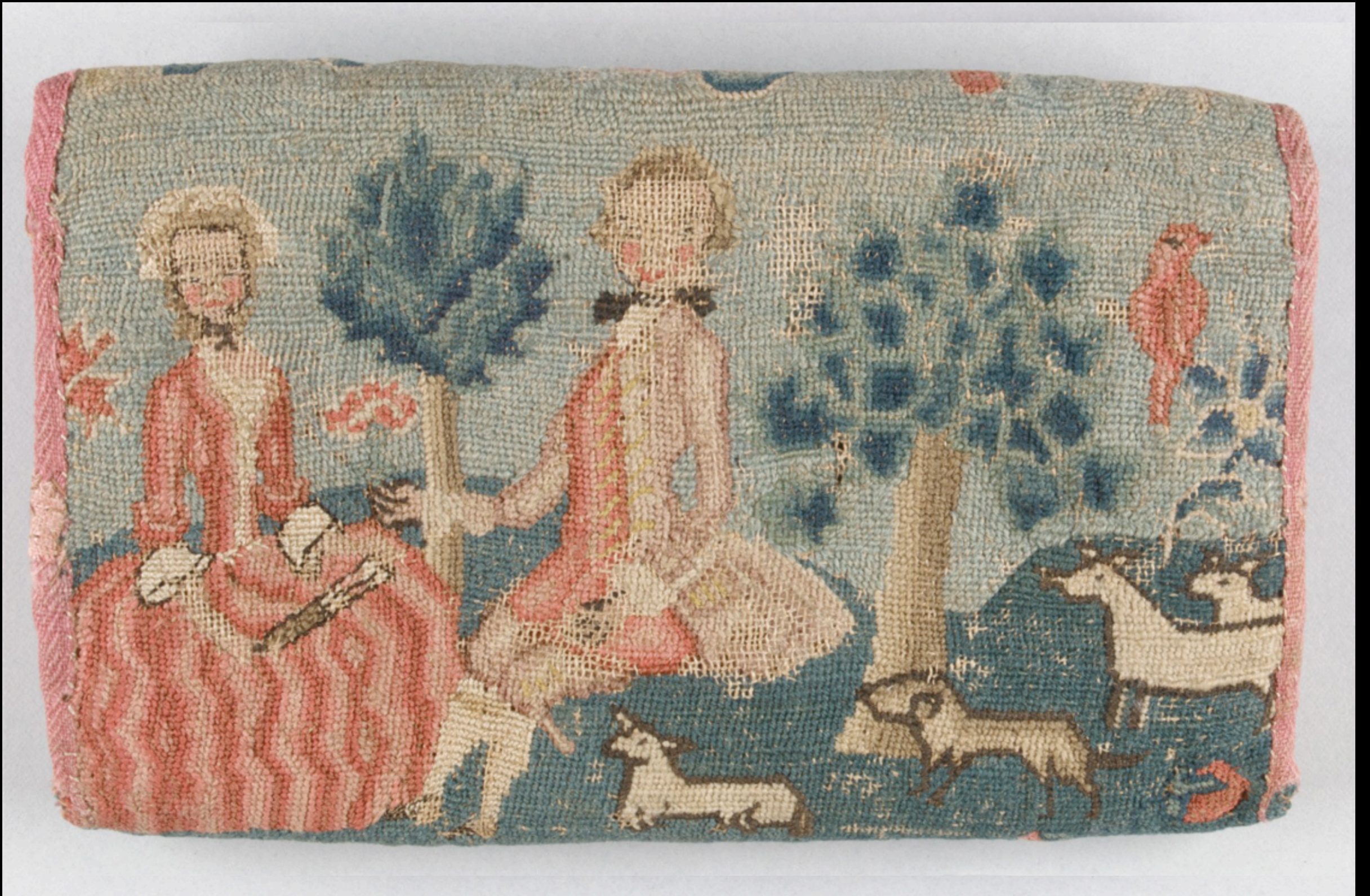
New England Wool Embroidered Pocket Book