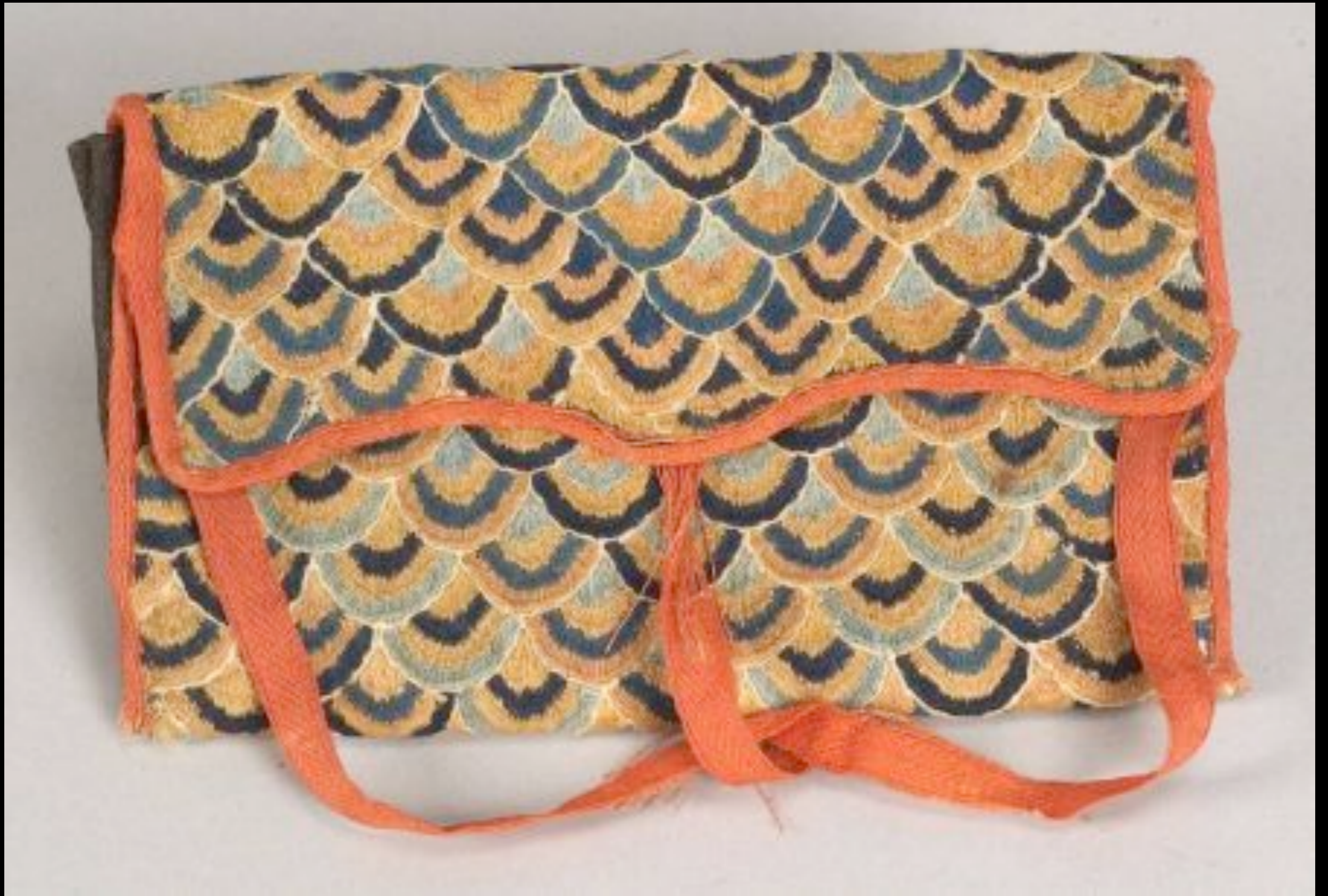
American Wool Embroidered Pocket Book 18th Century (Skinner)