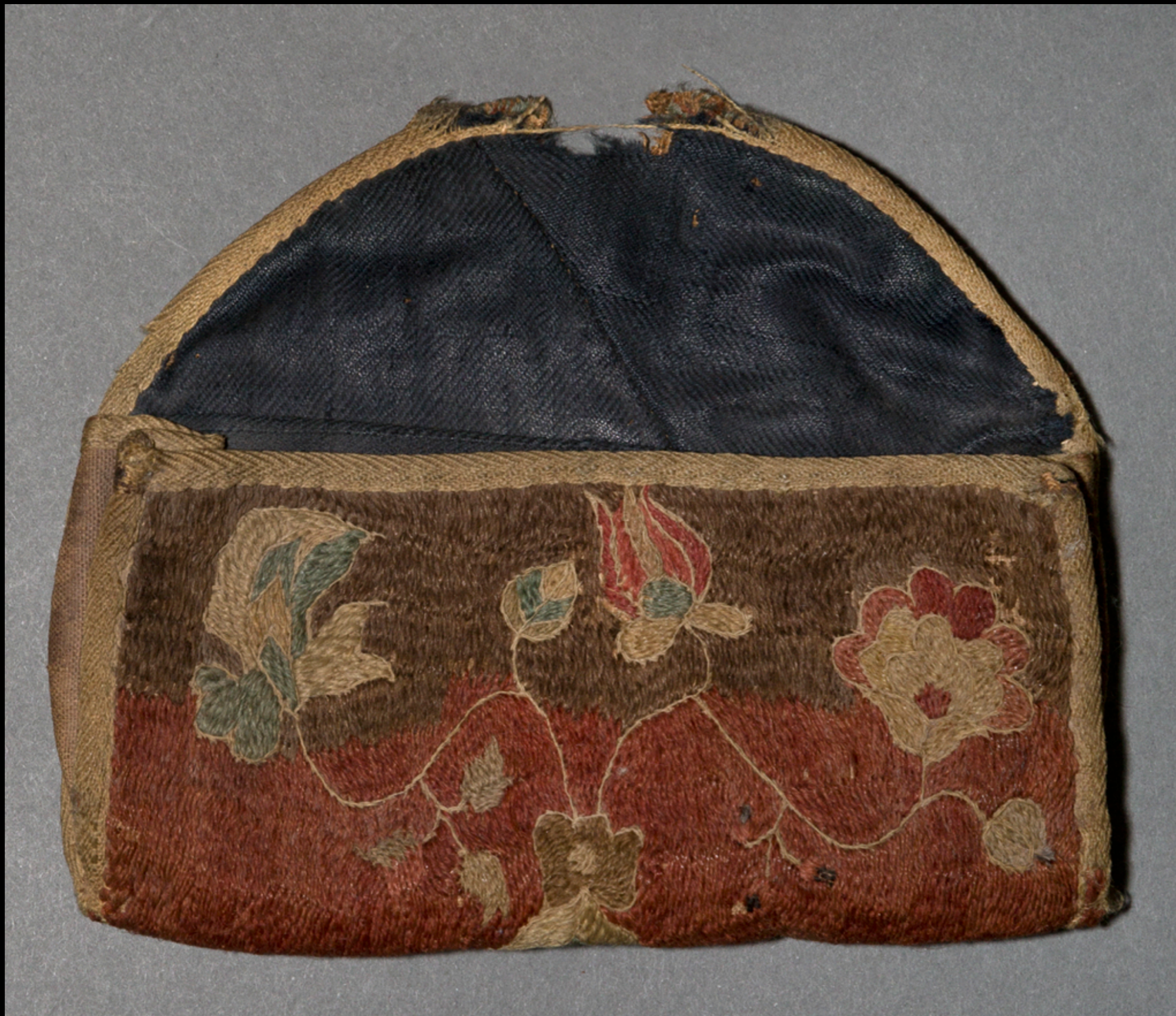
American Wool Embroidered Pocket Book c. 1750 - 1800