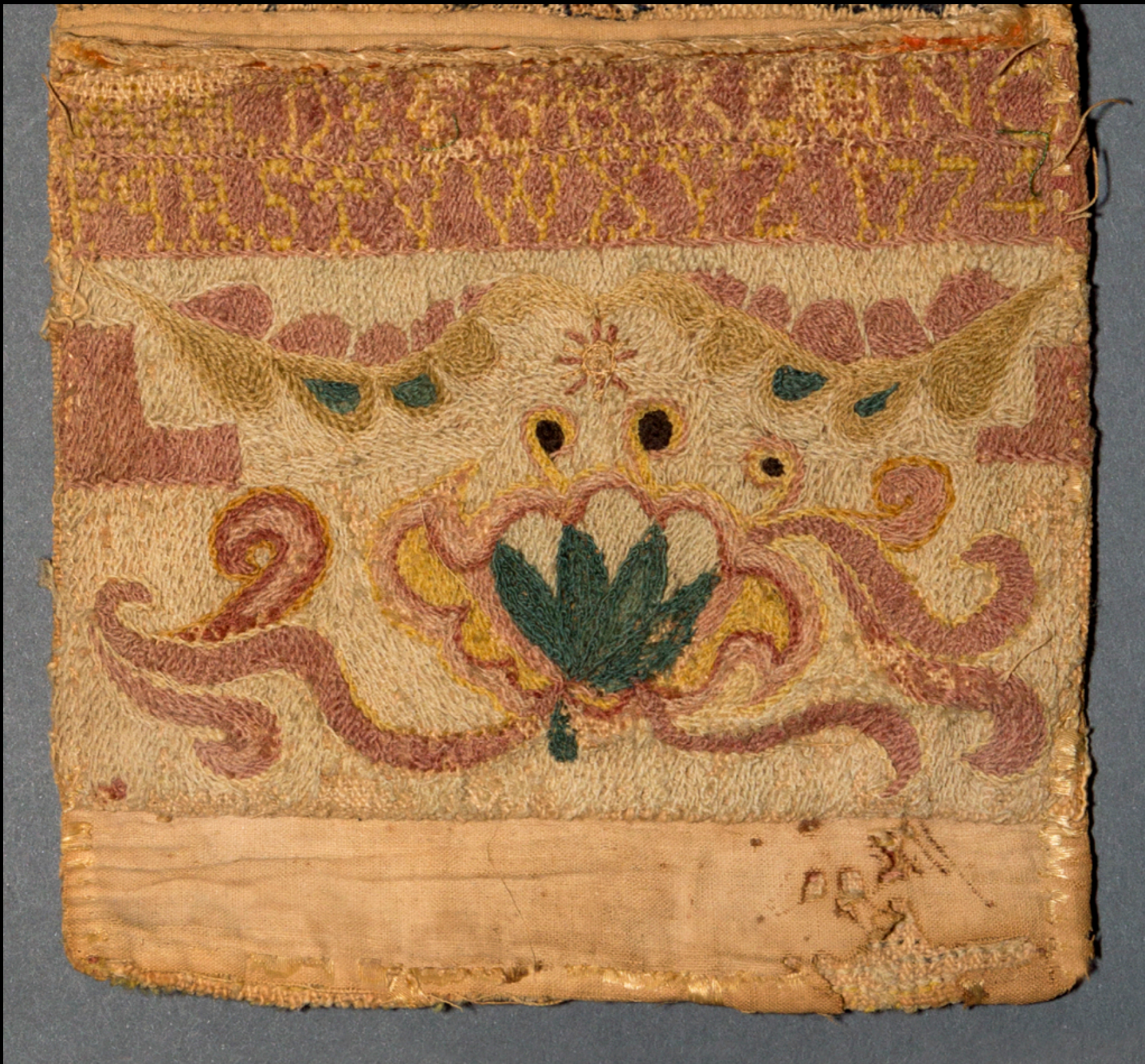
American Wool & Silk Embroidered Pocket Book