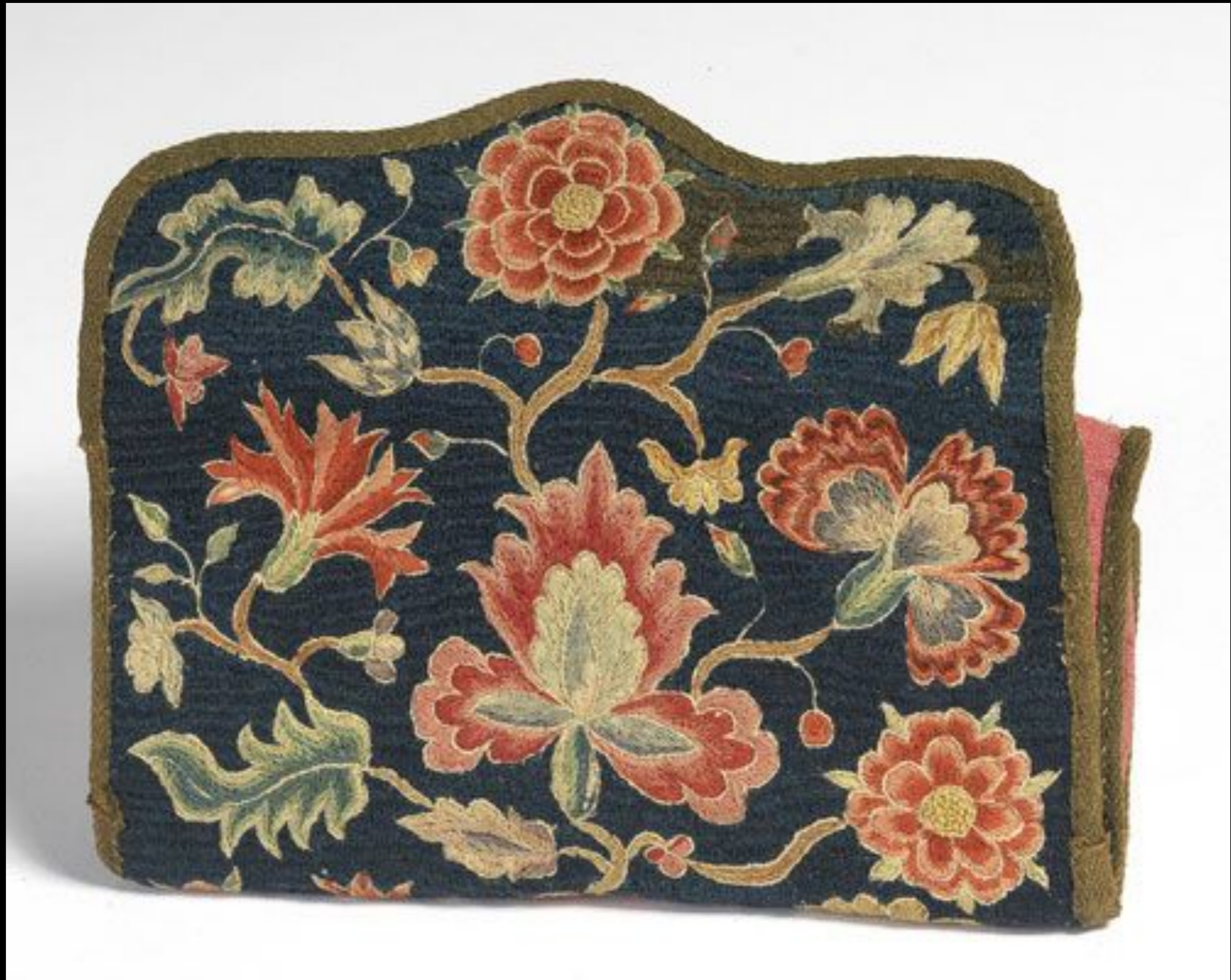
Wool Embroidered Pocket Book "MARY EATON APRIL 3 1764" (Jan Whitlock)