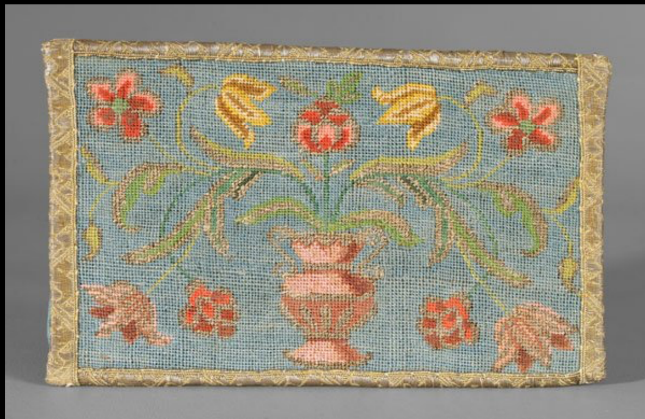
French Wool & Metallic Thread Embroidered Pocket Book Mid 18th Century (Brunk Auctions)