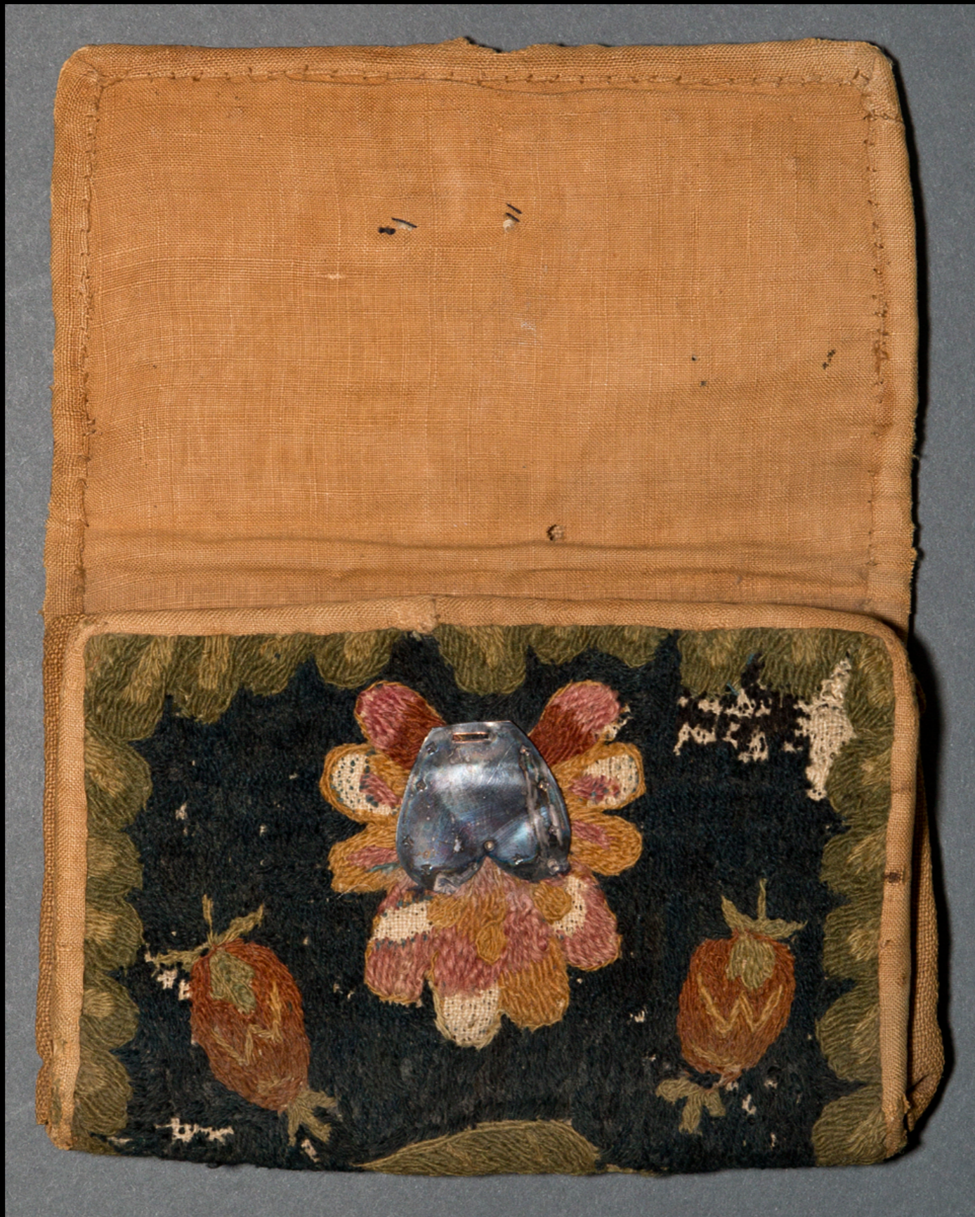
American Wool Embroidered Pocket Book c. 1740 - 1780 (Winterthur)