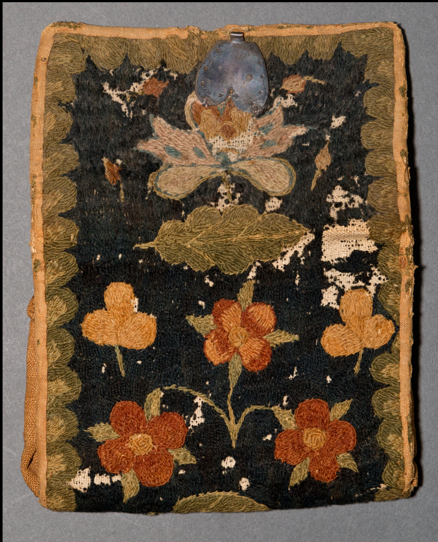
American Wool Embroidered Pocket Book c. 1740 - 1780 (Winterthur)