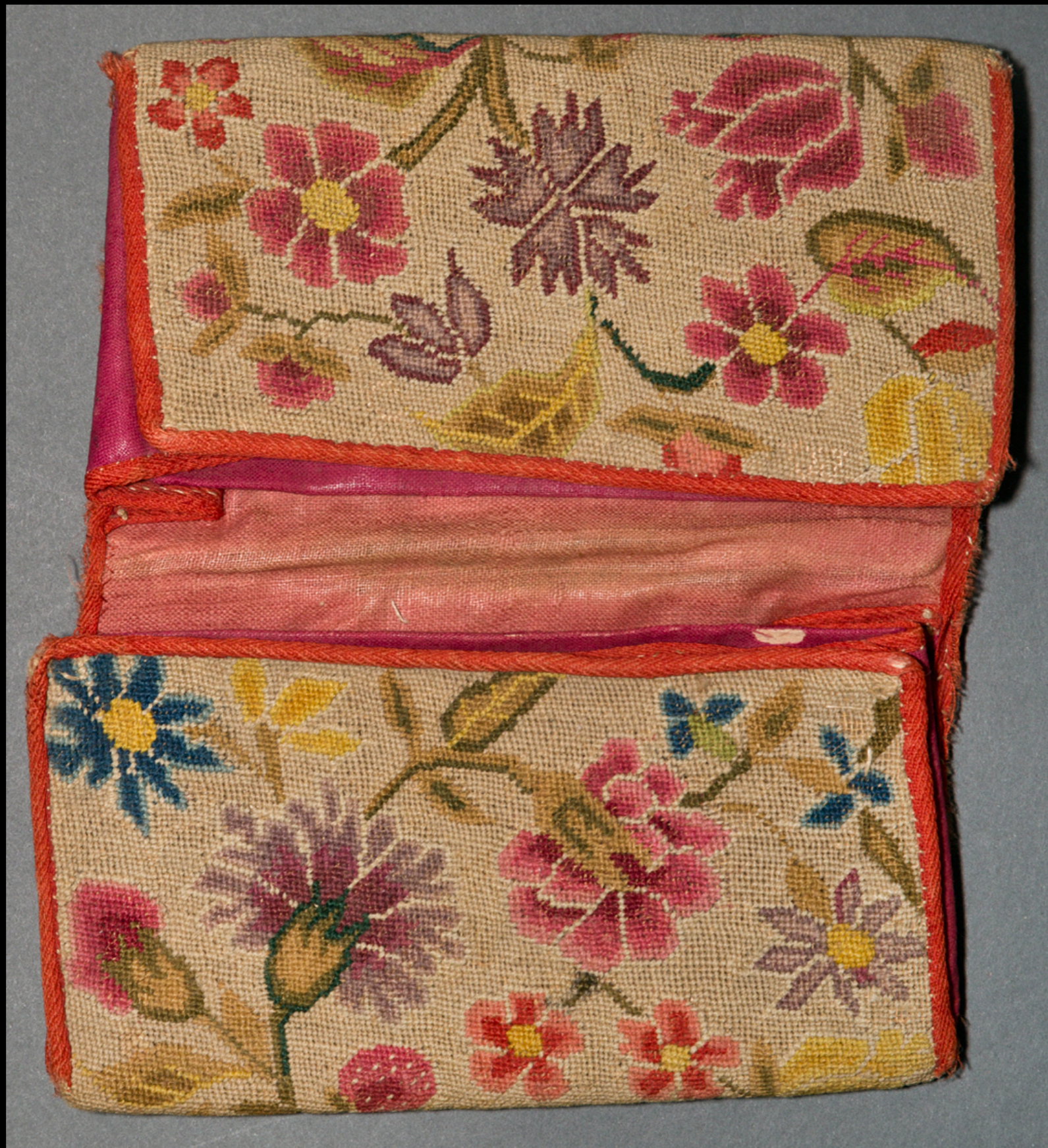
American Wool Embroidered Pocket Book