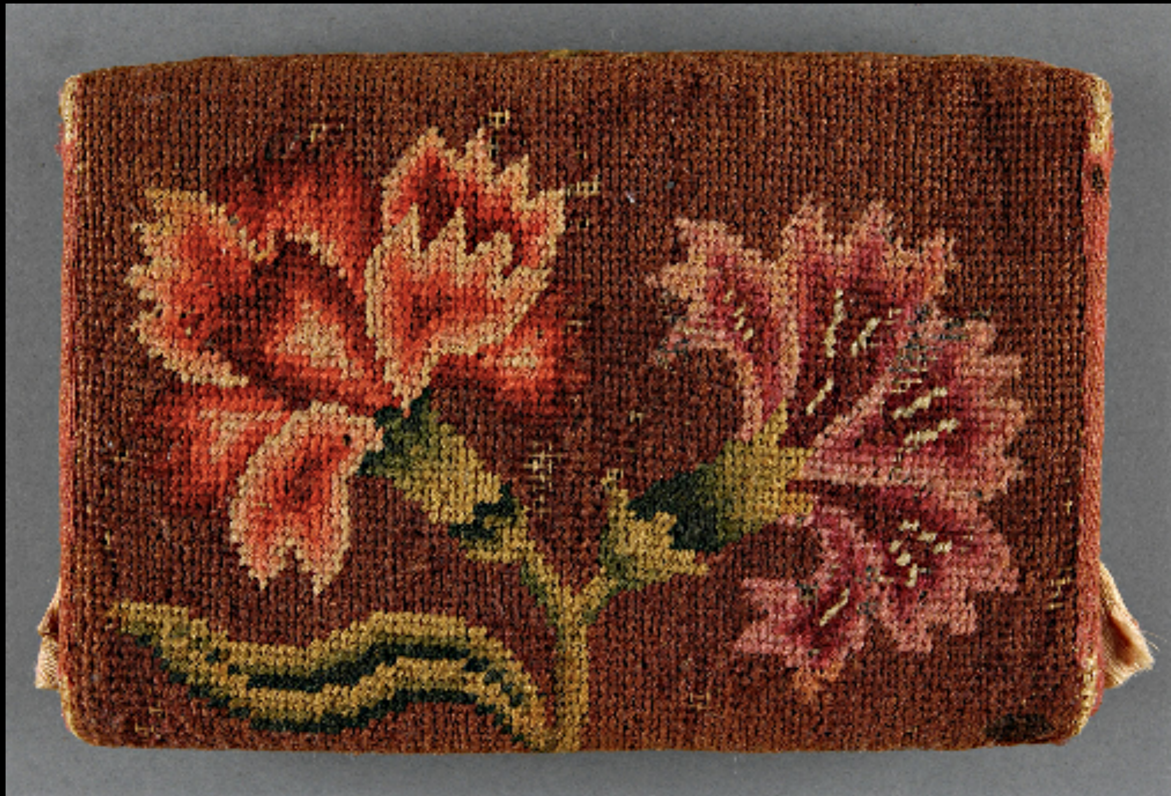
New England Wool Embroidered Pocket Book Possibly by Mary Flower 1765 (Private Collection)