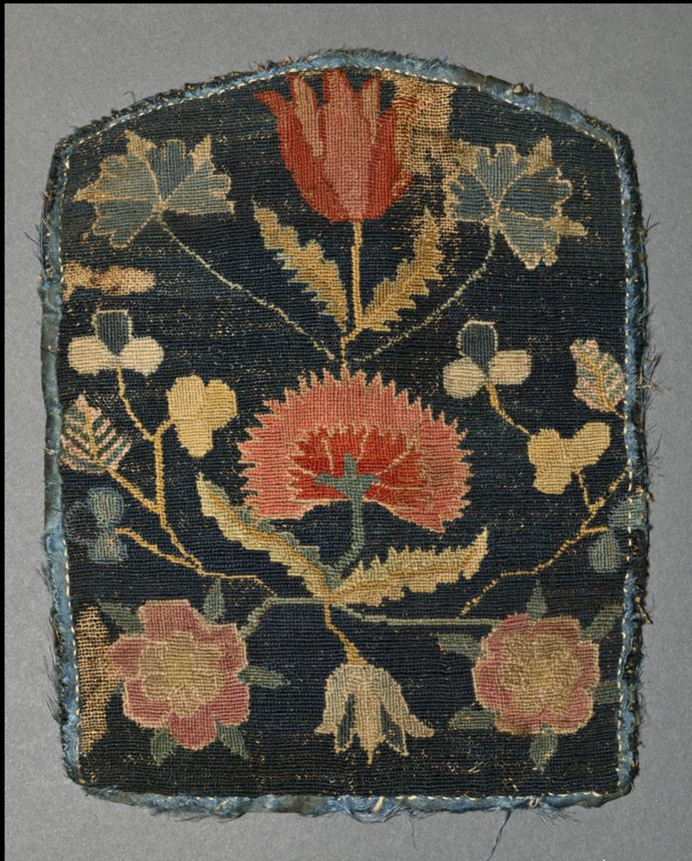
American Wool Embroidered Pocket Book c. 1730 - 1780