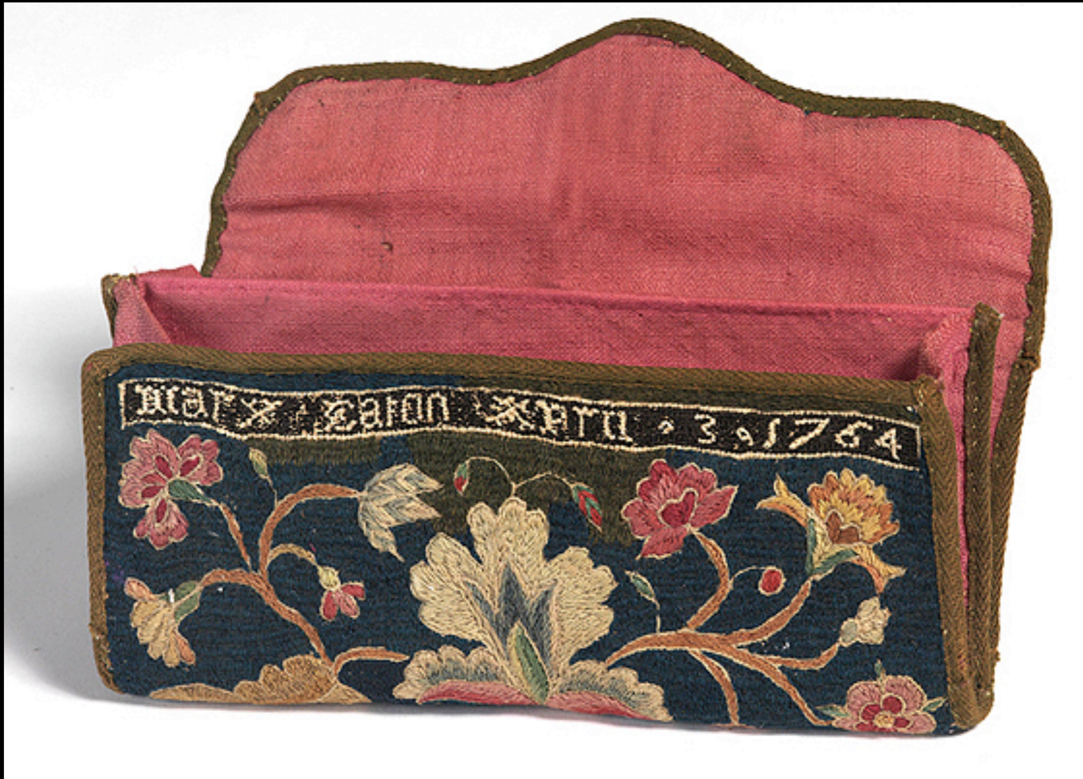
Wool Embroidered Pocket Book "MARY EATON APRIL 3 1764" (Jan Whitlock)