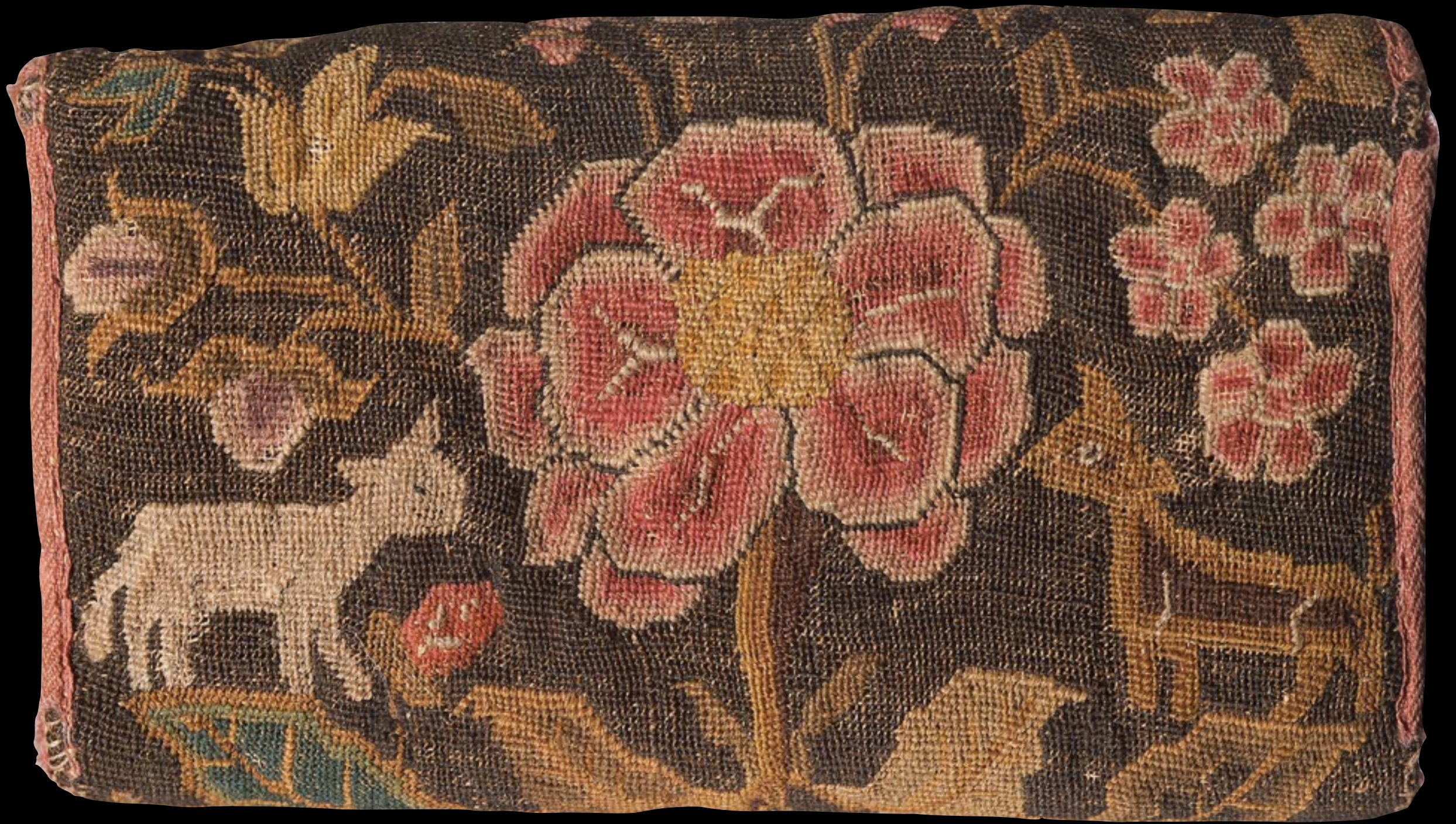
New England Wool Embroidered Pocket Book