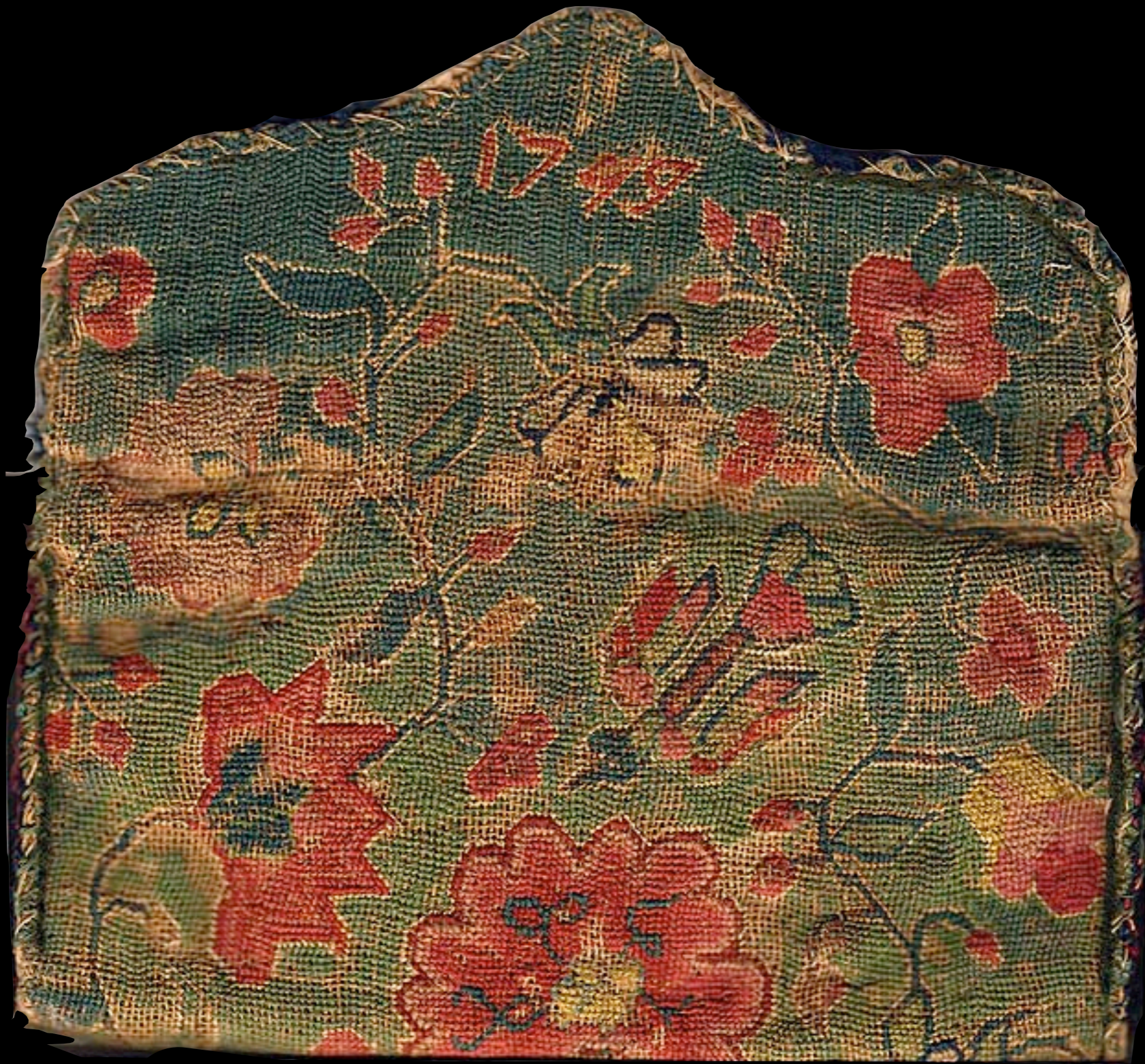
Wool Embroidered Pocket Book