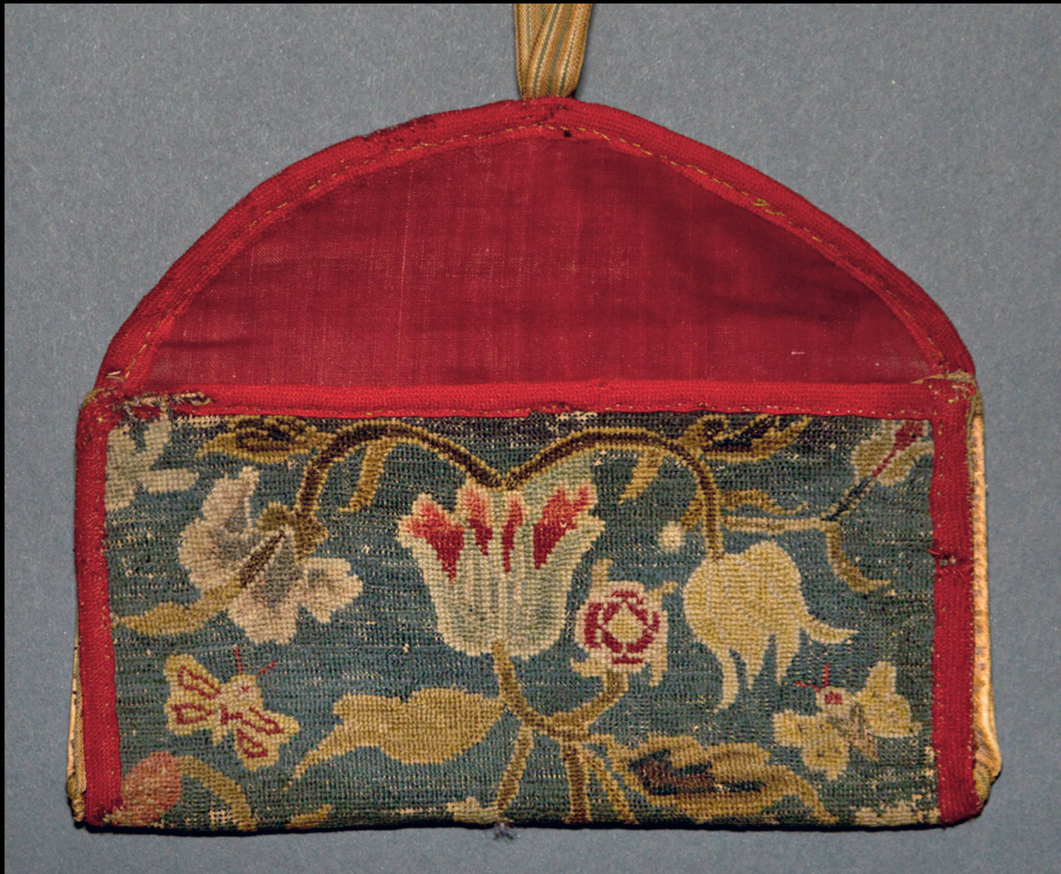
American Wool Embroidered Pocket Book