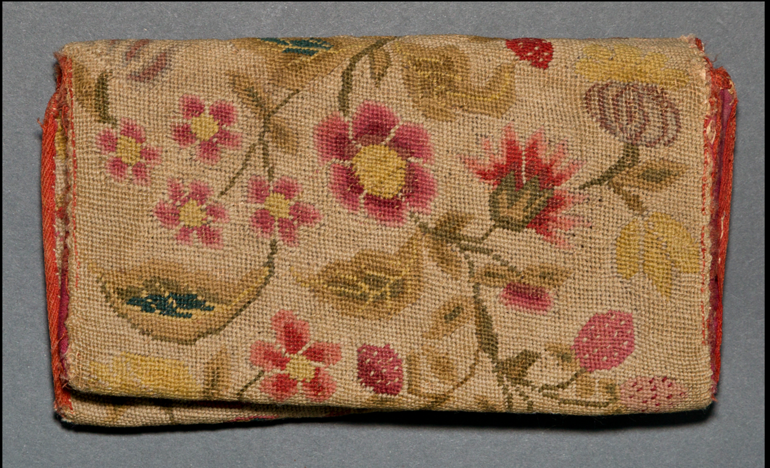
American Wool Embroidered Pocket Book