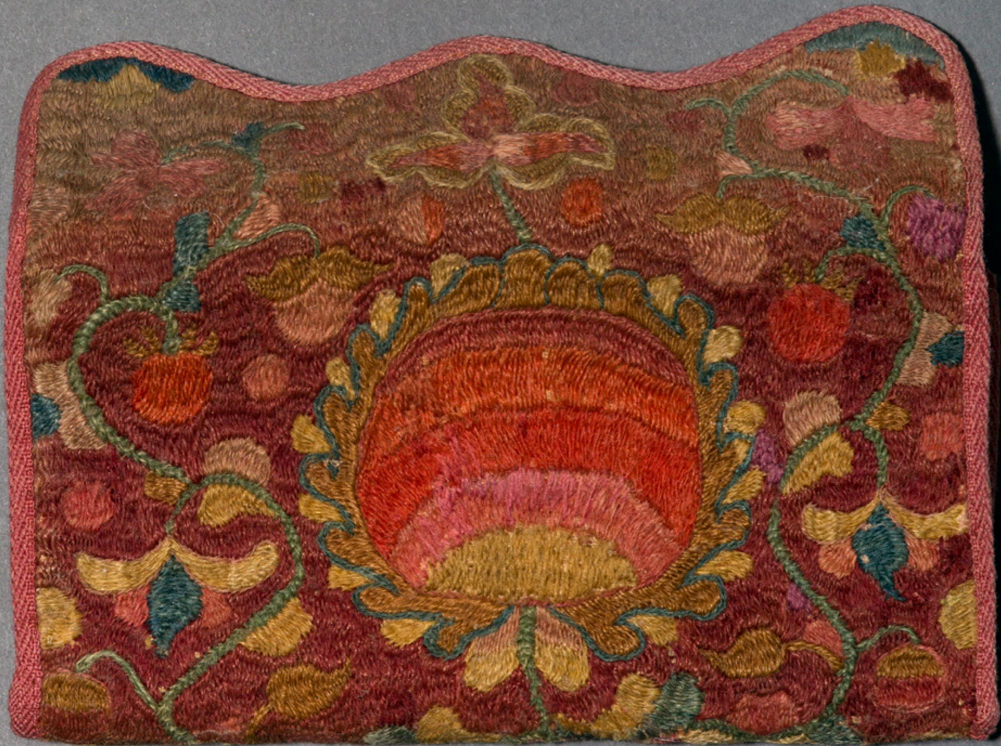
American Wool Embroidered Pocket Book