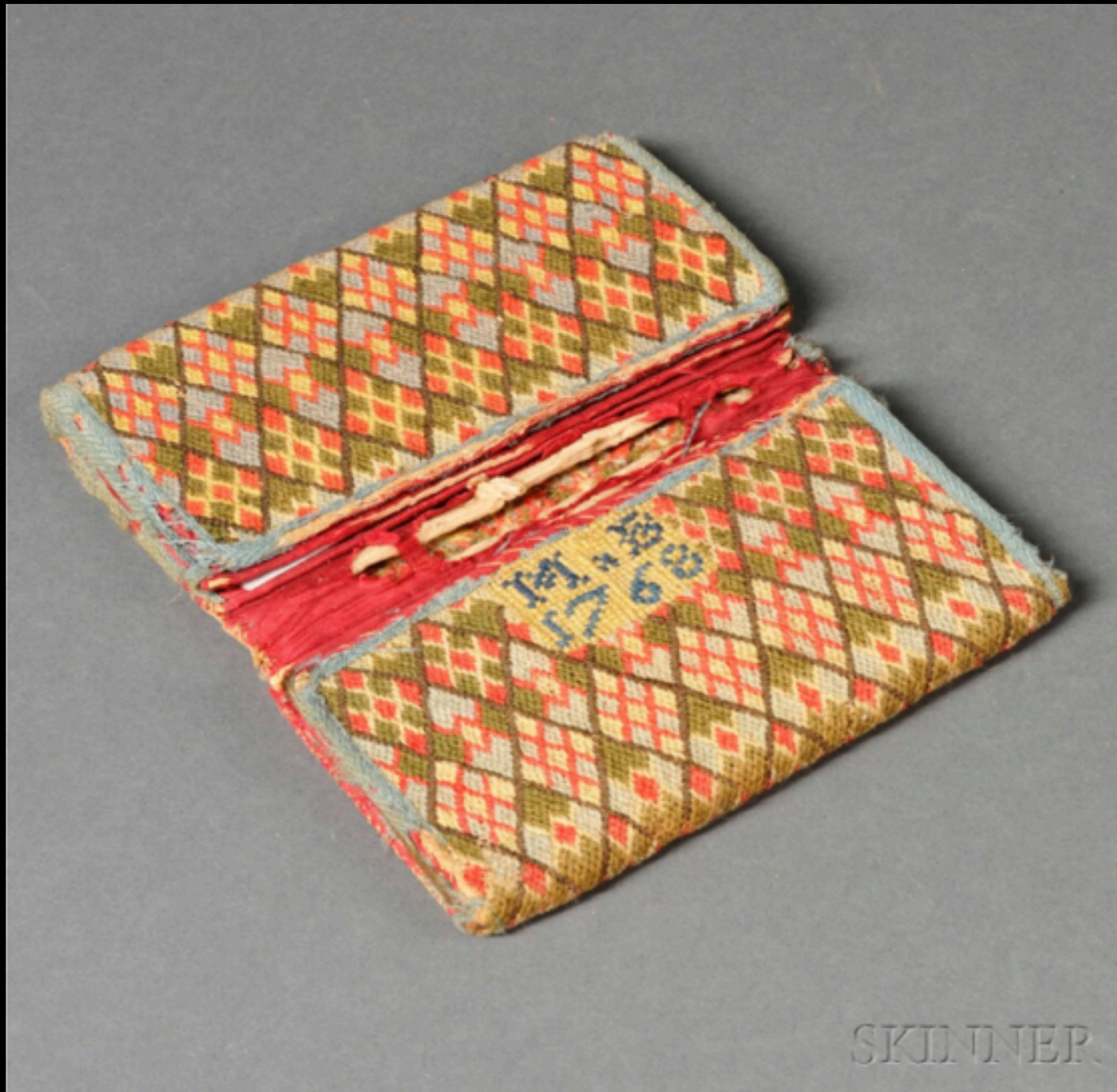
New England (?) Wool Embroidered Pocket Book "M x B 1768" (Skinner)