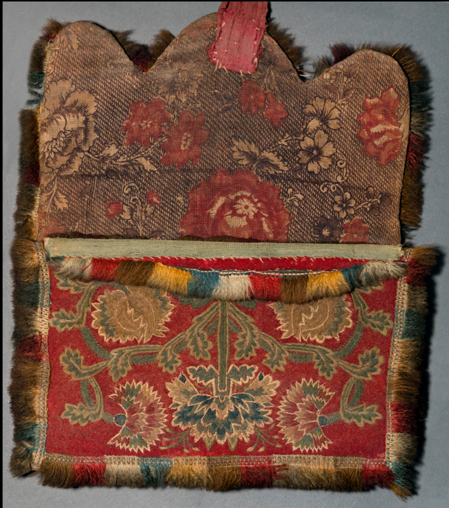
English Wool Embroidered Pocket Book