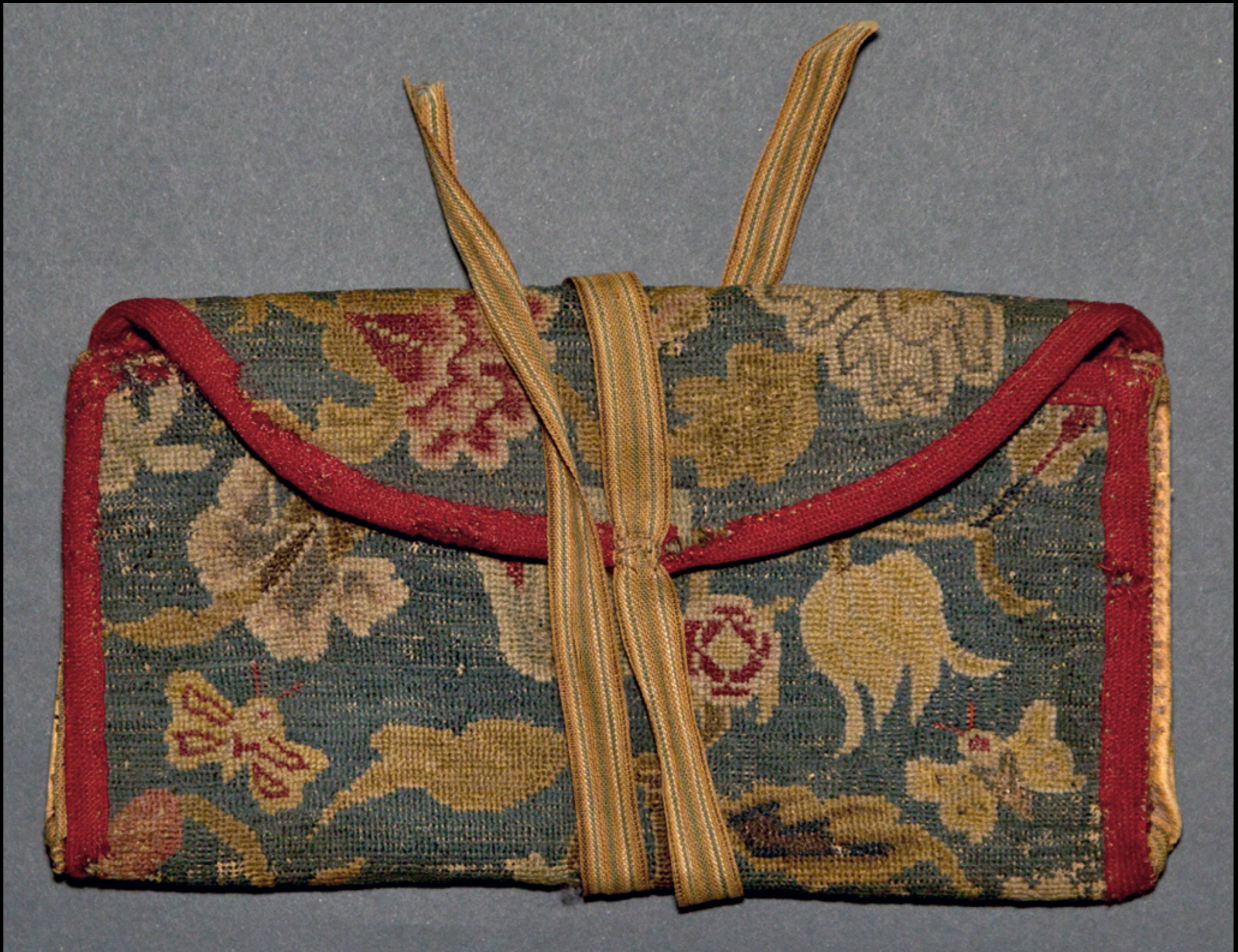
American Wool Embroidered Pocket Book