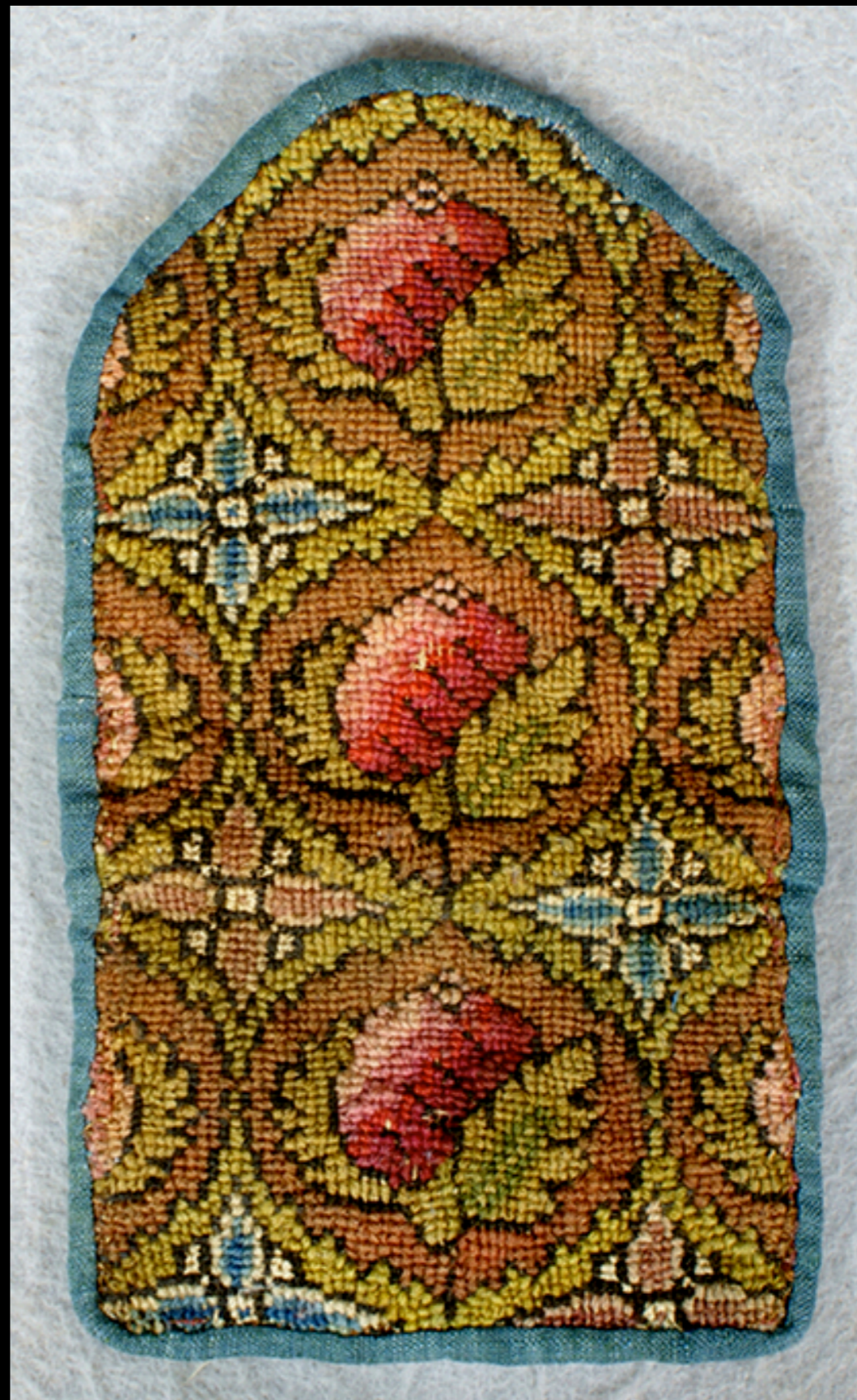
Wool Embroidered Pocket Book "1774"