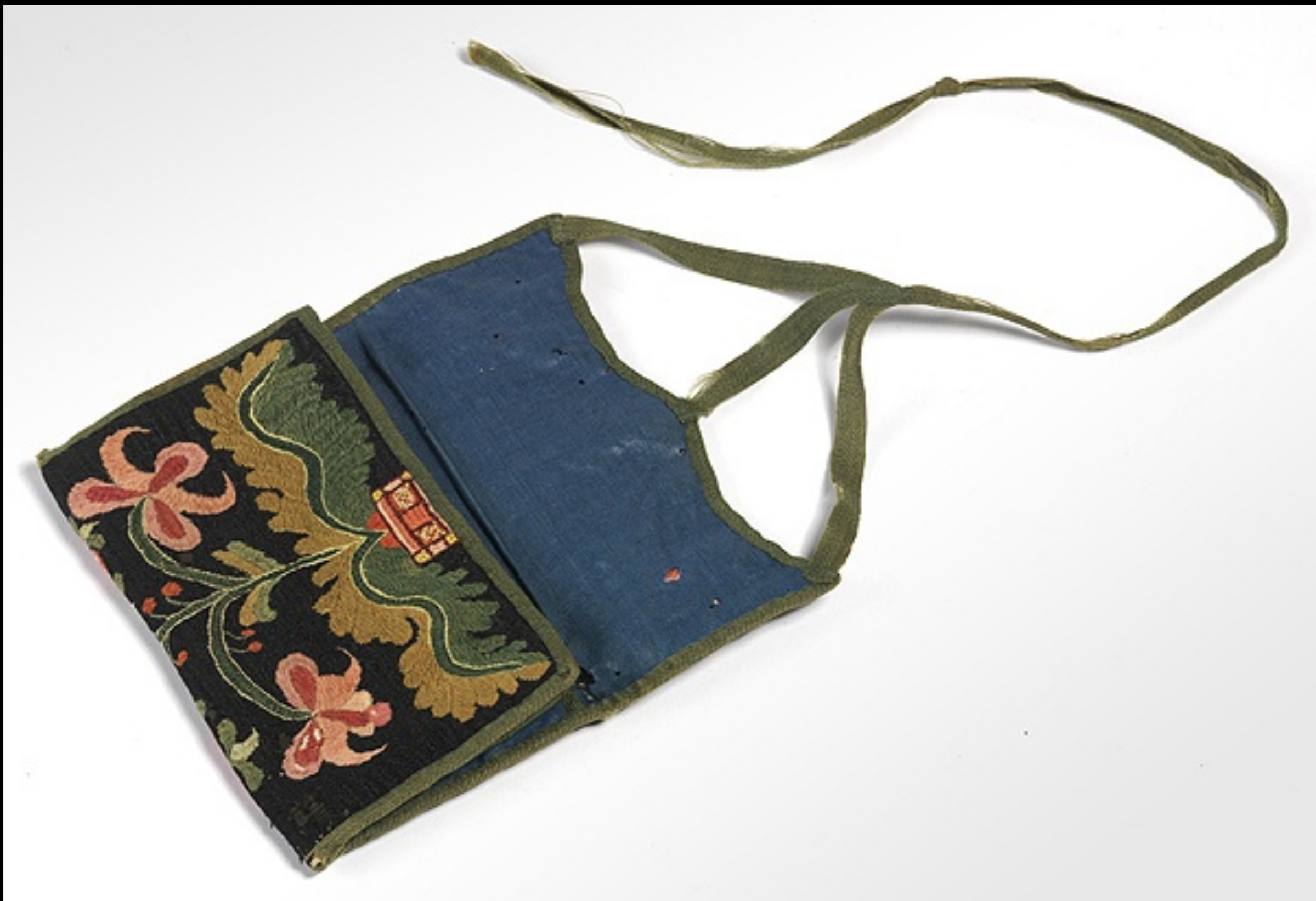
Wool Crewel Worked Pocket Book with Tree of Life Motif Signed "ZS" 18th Century (Jan Whitlock Textiles)