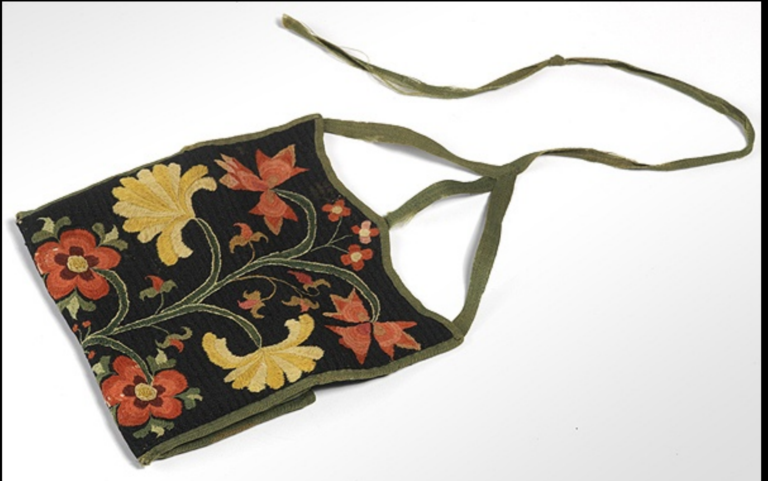
Wool Crewel Worked Pocket Book with Tree of Life Motif Signed "ZS" 18th Century (Jan Whitlock Textiles)