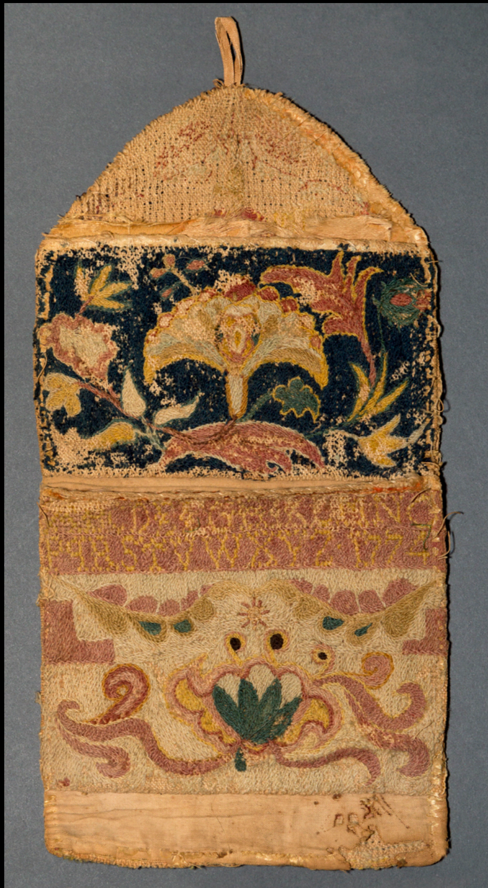
American Wool & Silk Embroidered Pocket Book