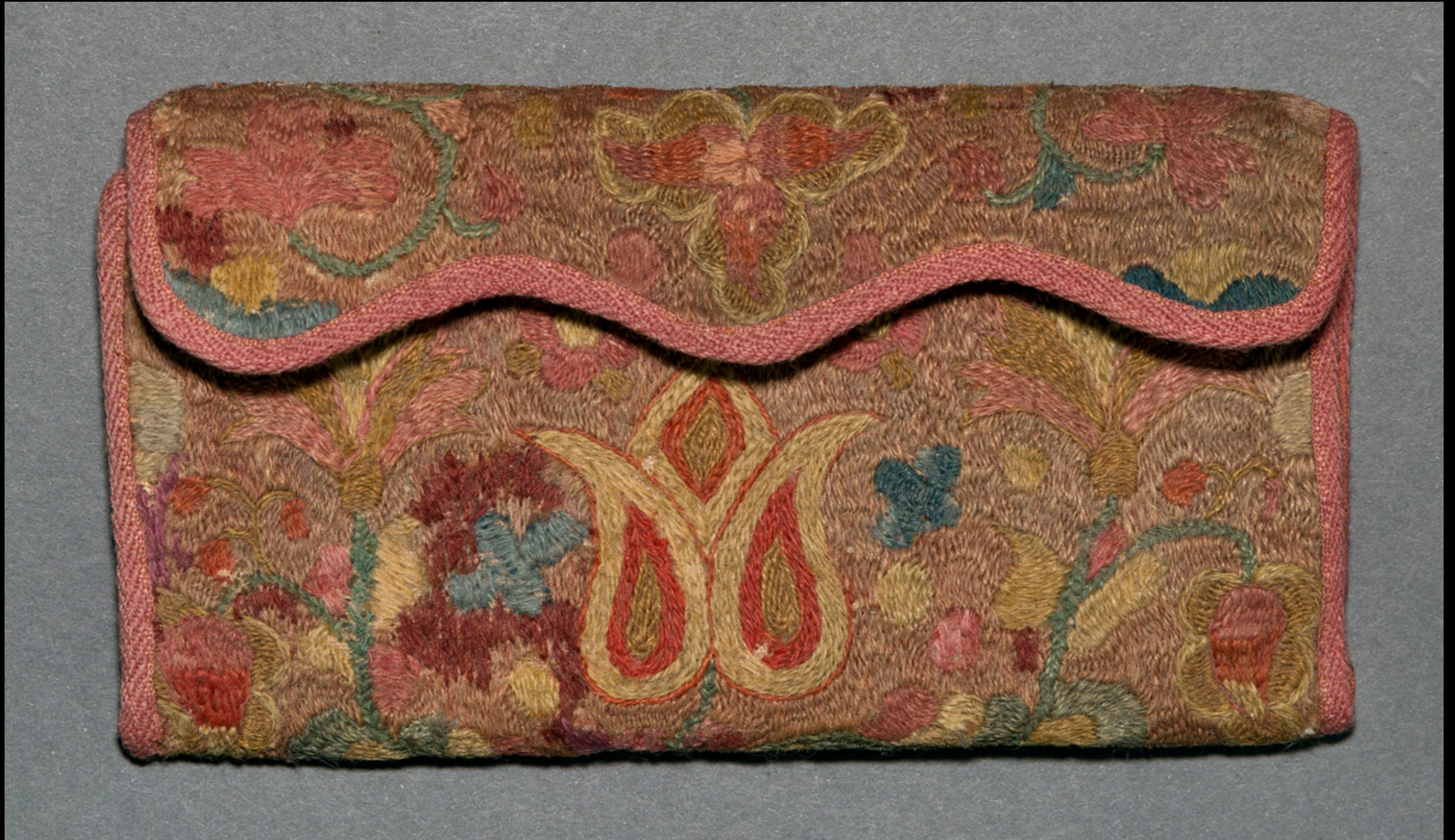
American Wool Embroidered Pocket Book