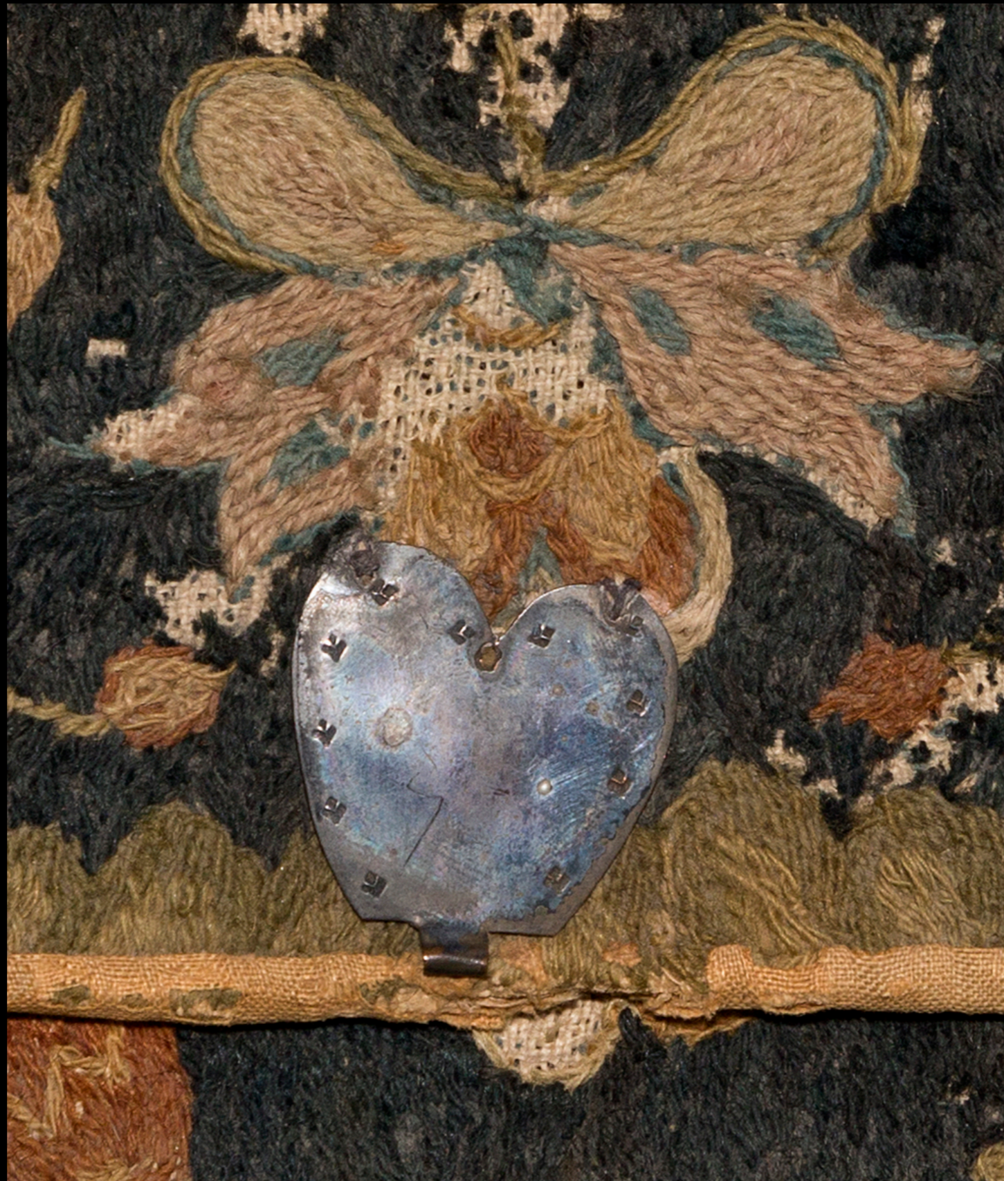
American Wool Embroidered Pocket Book c. 1740 - 1780 (Winterthur)