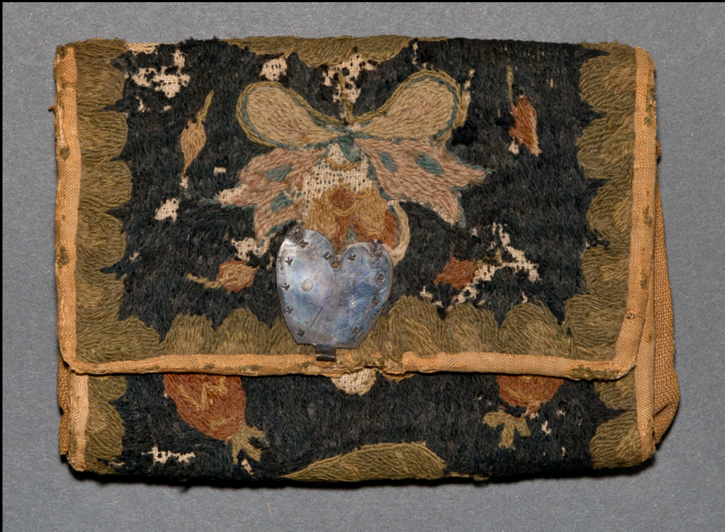
American Wool Embroidered Pocket Book c. 1740 - 1780 (Winterthur)