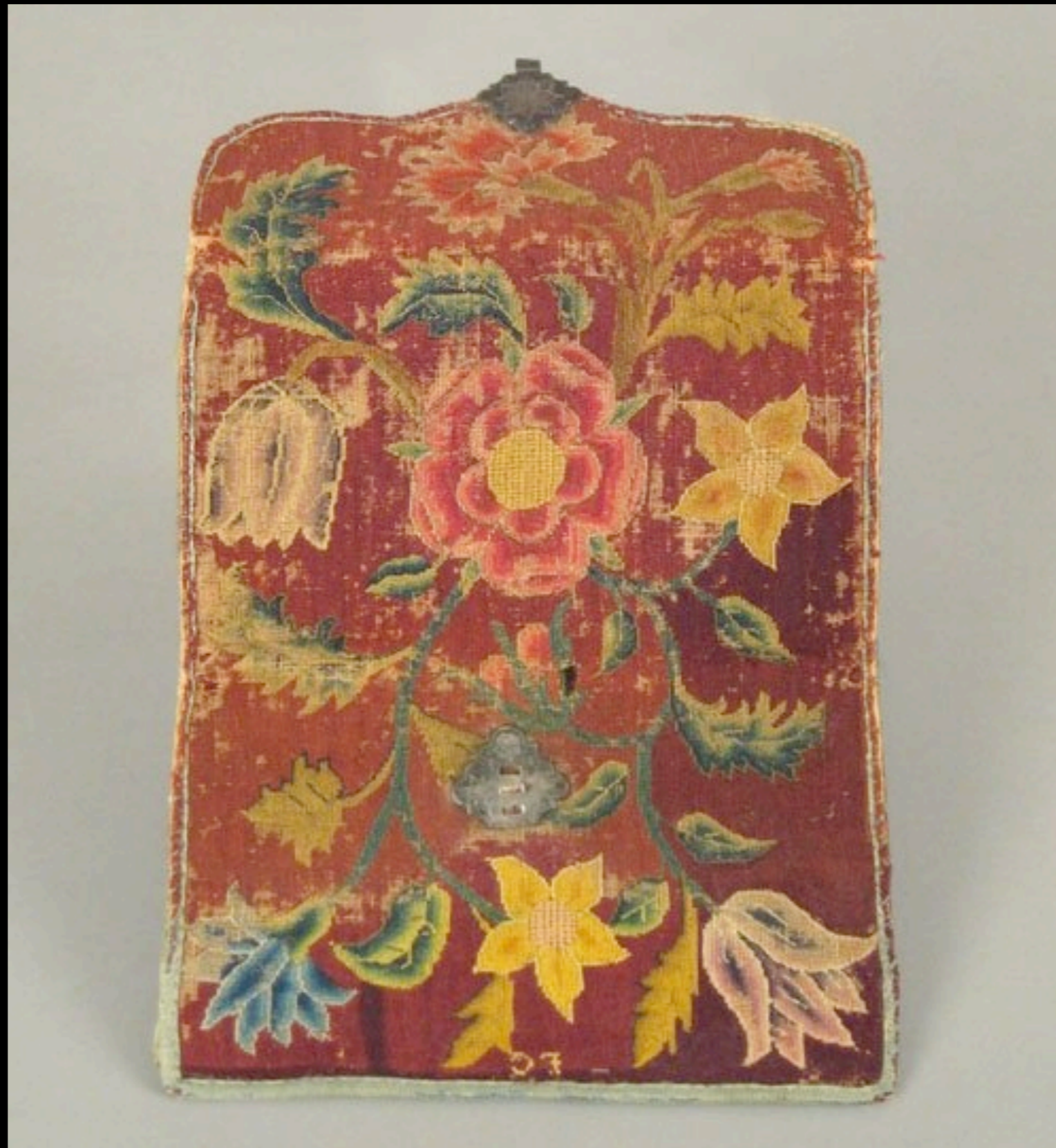
Pennsylvania Wool Embroidered Pocket Book from Philadelphia c. 1760 (Machmer Collection)