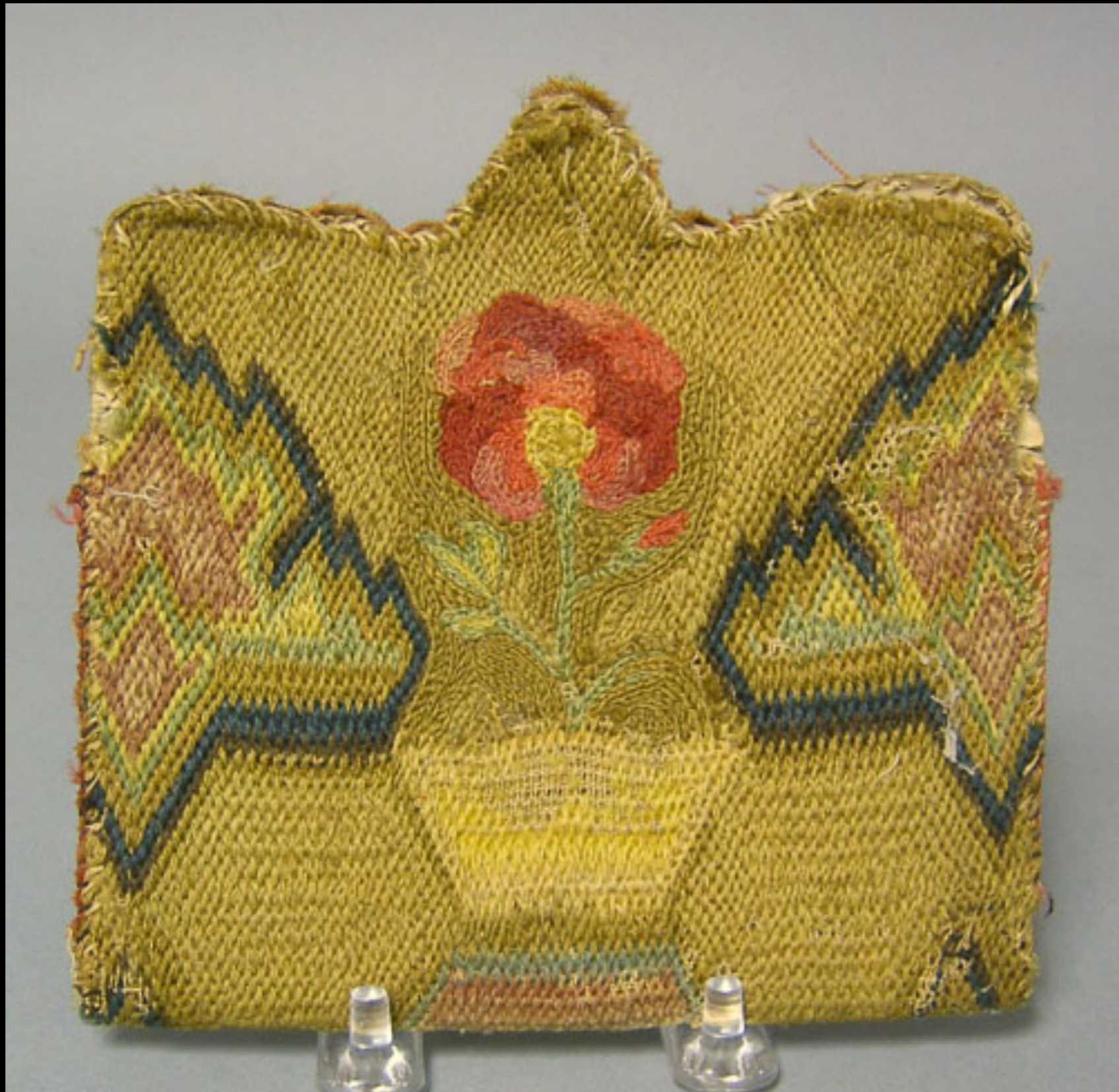
American Wool Embroidered Pocket Book Late 18th Century (Pook & Pook)