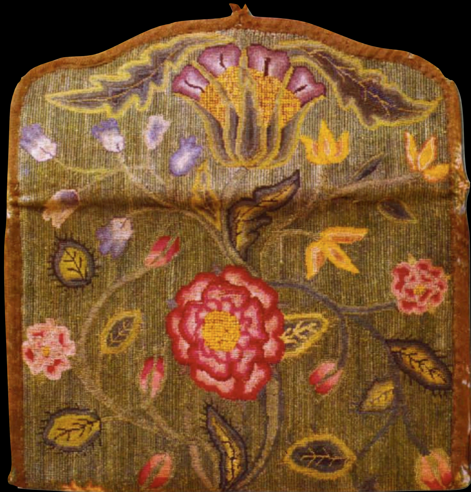
American Wool Embroidered Pocket Book from Pennsylvania