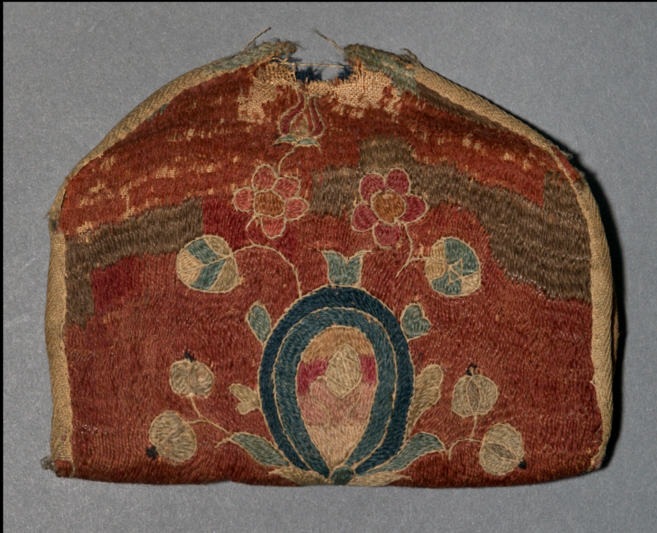
American Wool Embroidered Pocket Book c. 1750 - 1800 (Winterthur)