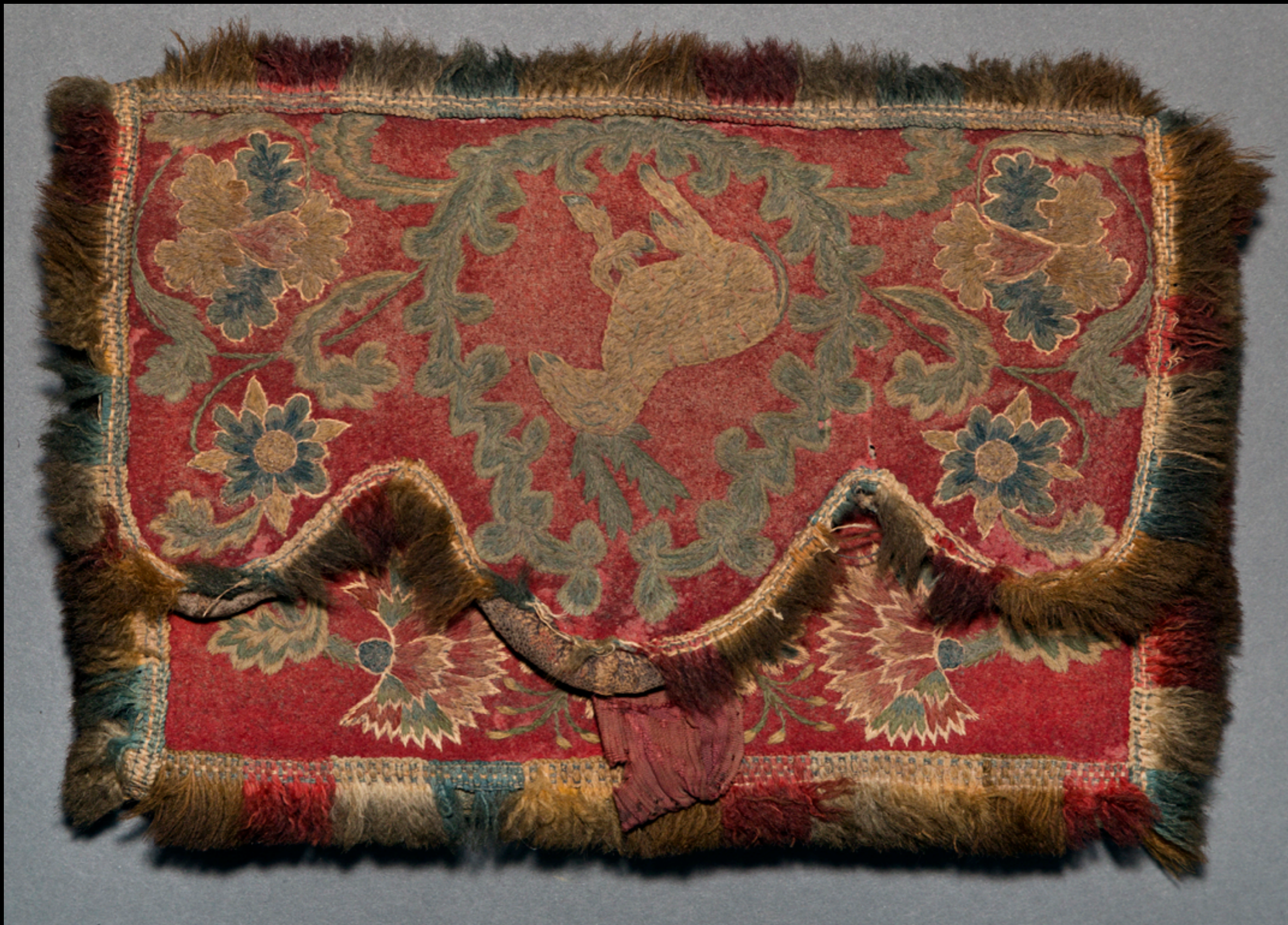
English Wool Embroidered Pocket Book