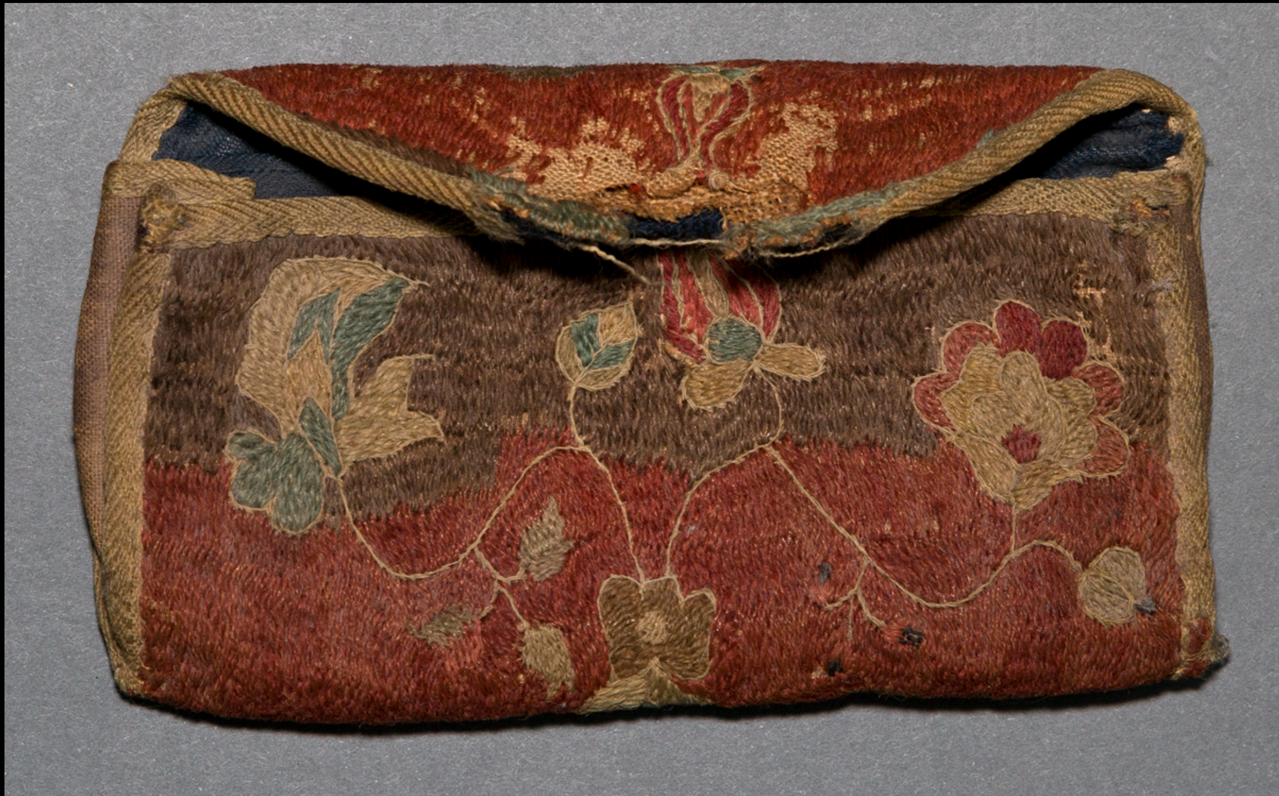
American Wool Embroidered Pocket Book c. 1750 - 1800