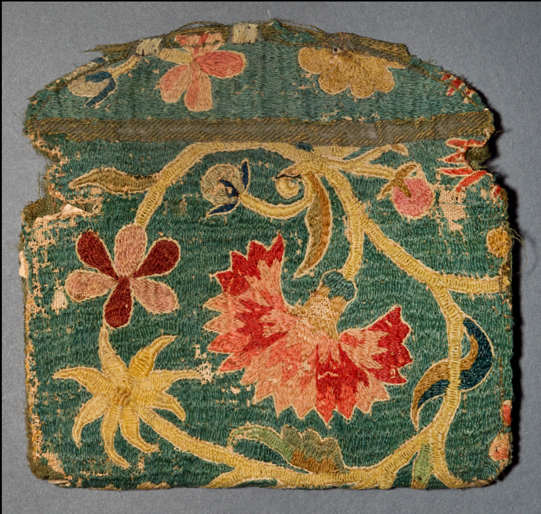
American Wool Embroidered Pocket Book