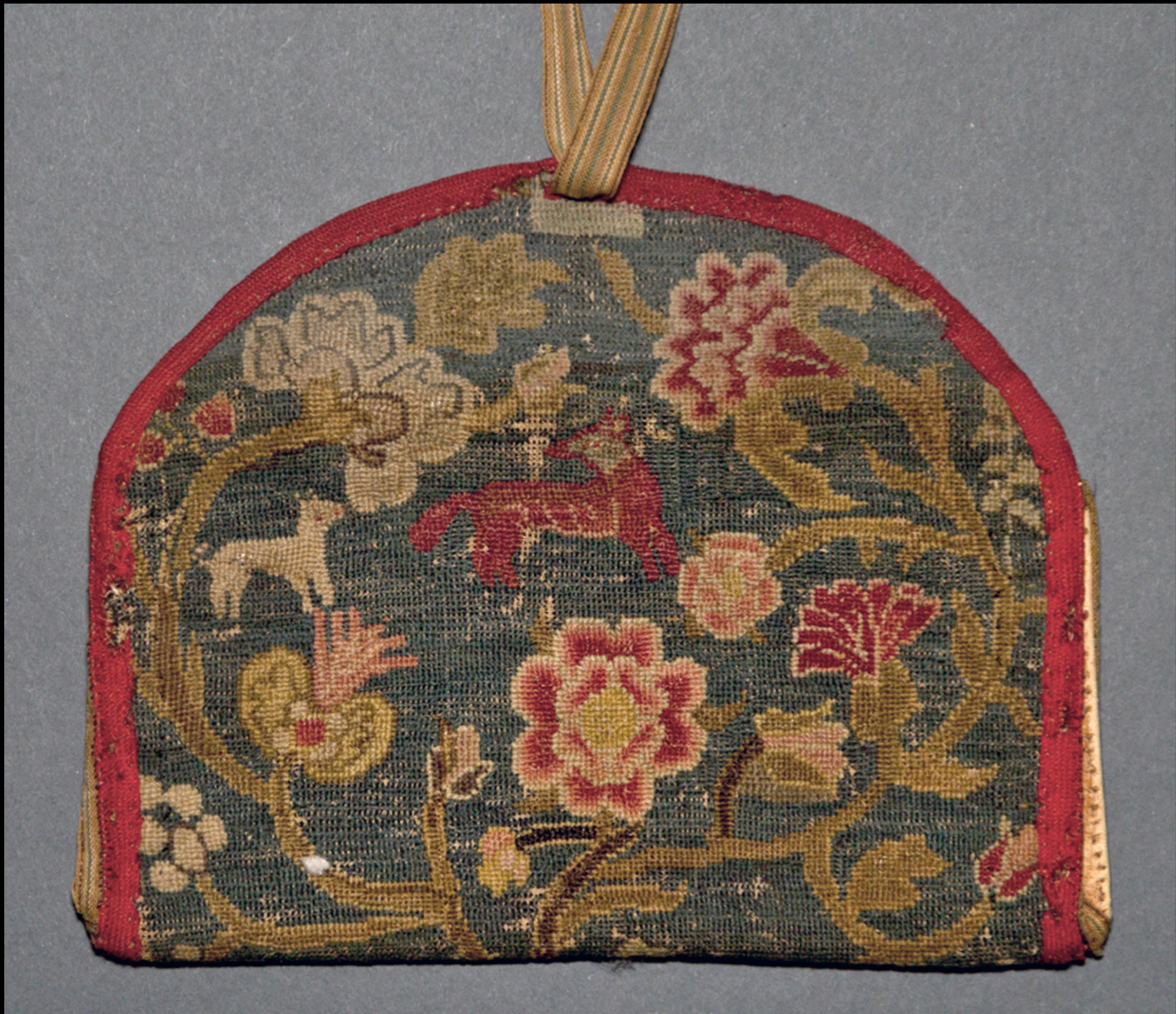
American Wool Embroidered Pocket Book