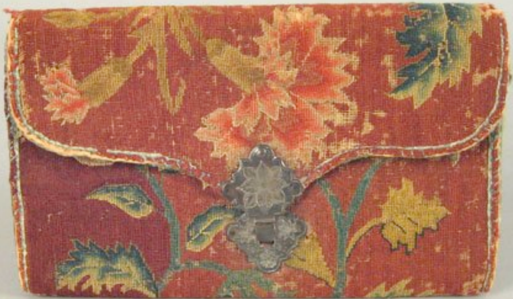
Pennsylvania Wool Embroidered Pocket Book from Philadelphia c. 1760 (Machmer Collection)