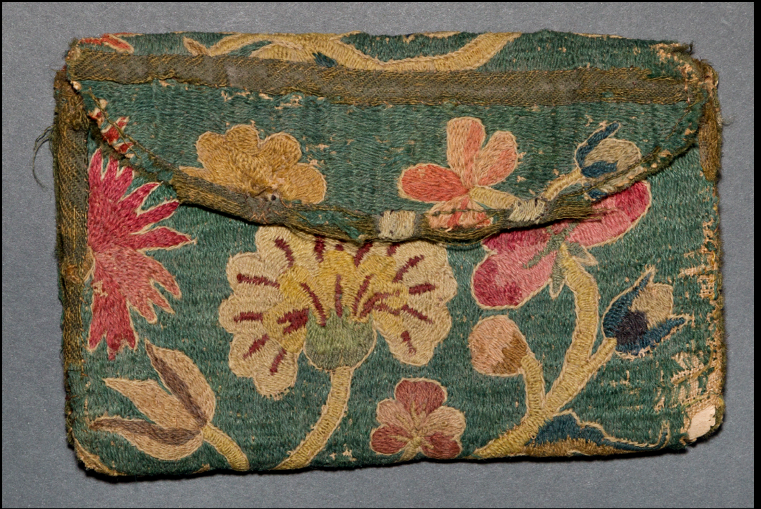
American Wool Embroidered Pocket Book c. 1740 - 1780 (Winterthur)