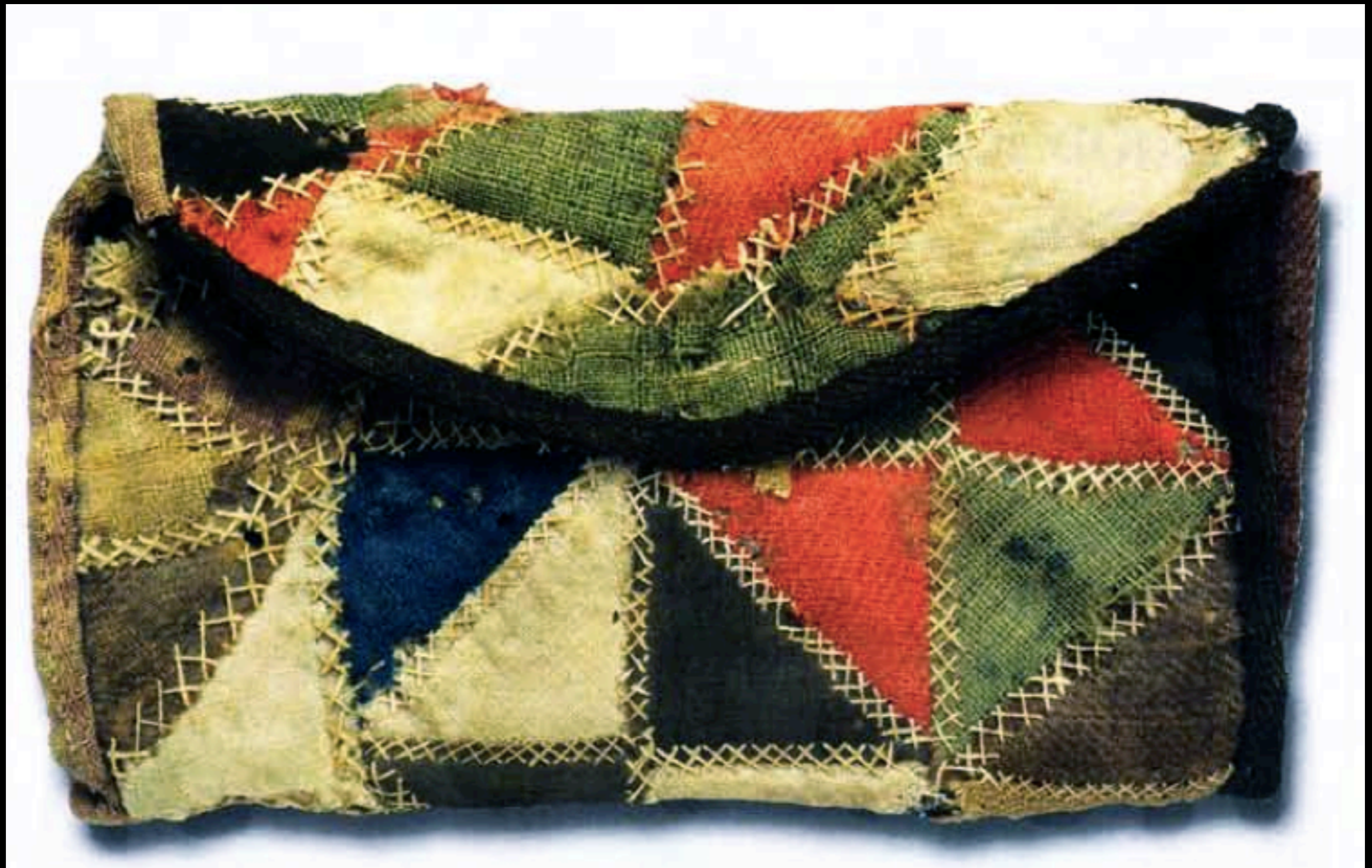
“Crazy Quilt” Pattern Pocketbook of Worsted Wool Scraps c. 1760 (Historic Deerfield Collection)