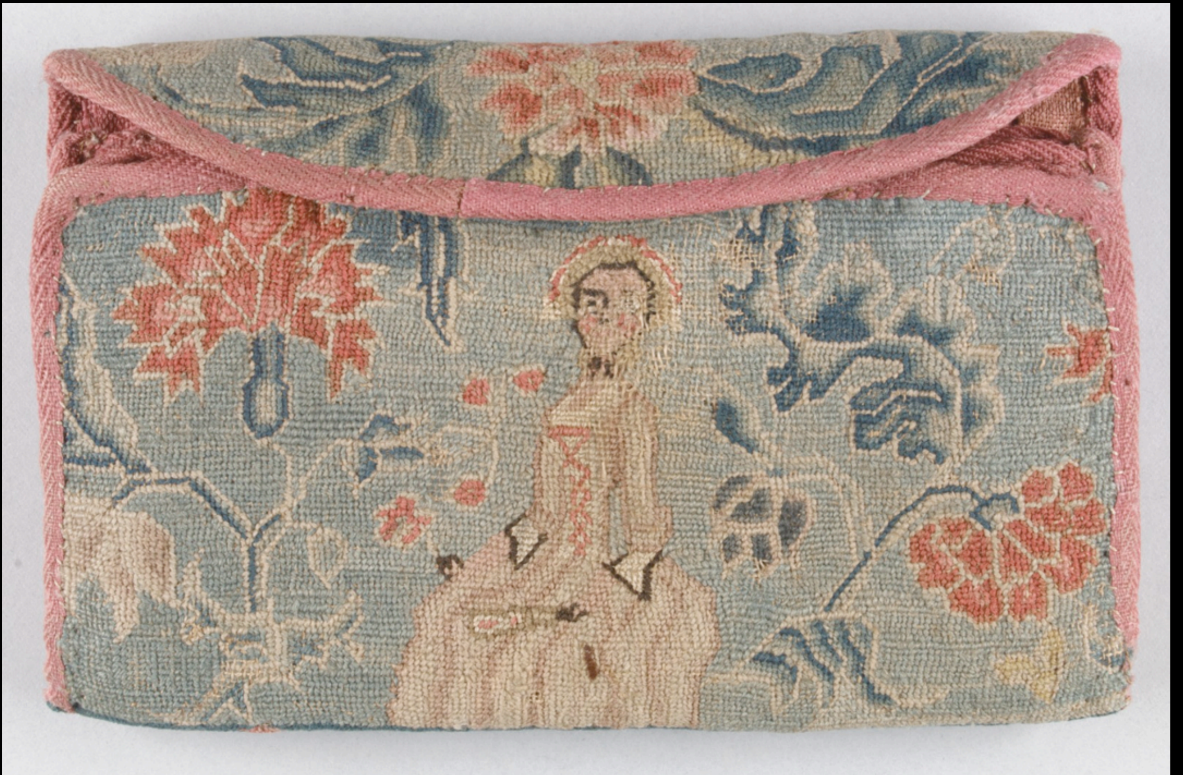
New England Wool Embroidered Pocket Book