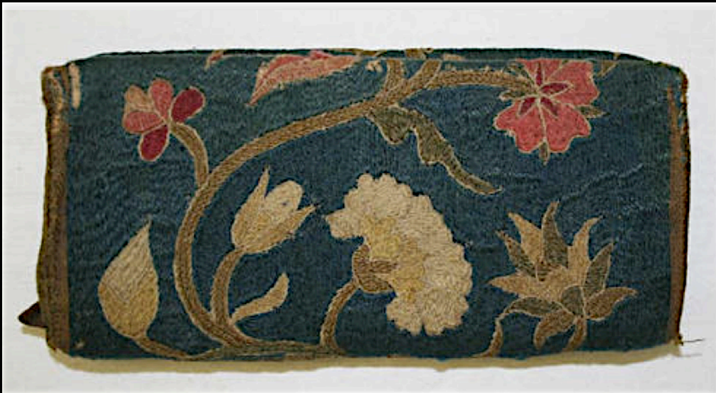
NewEngland Wool Embroidered Pocket Book