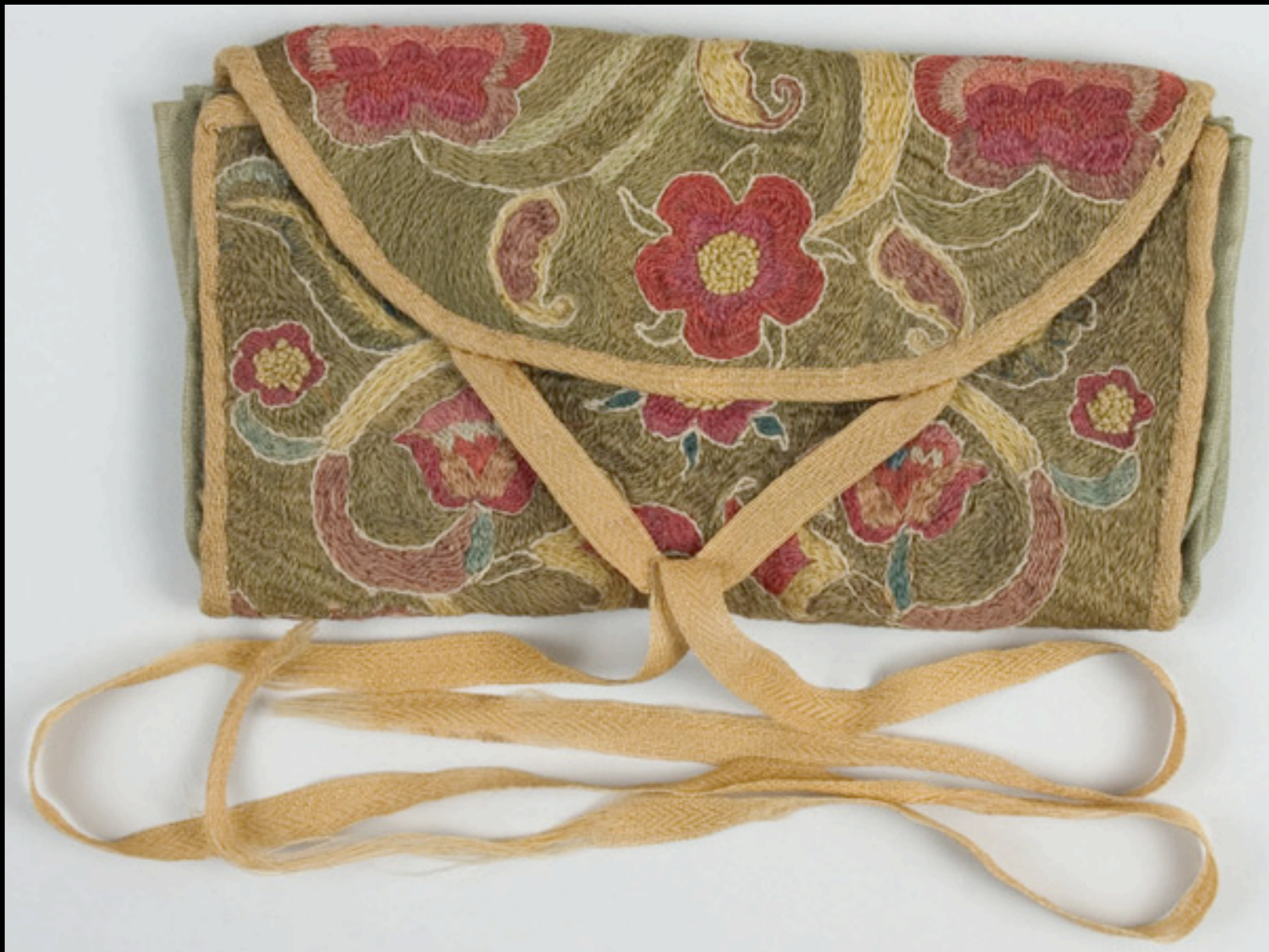
American Wool Embroidered Pocket Book from Townsend, Massachusetts Homestead Watercolor - 2nd Half 18th Century (Antiques Associates at West Townsend, Inc.)