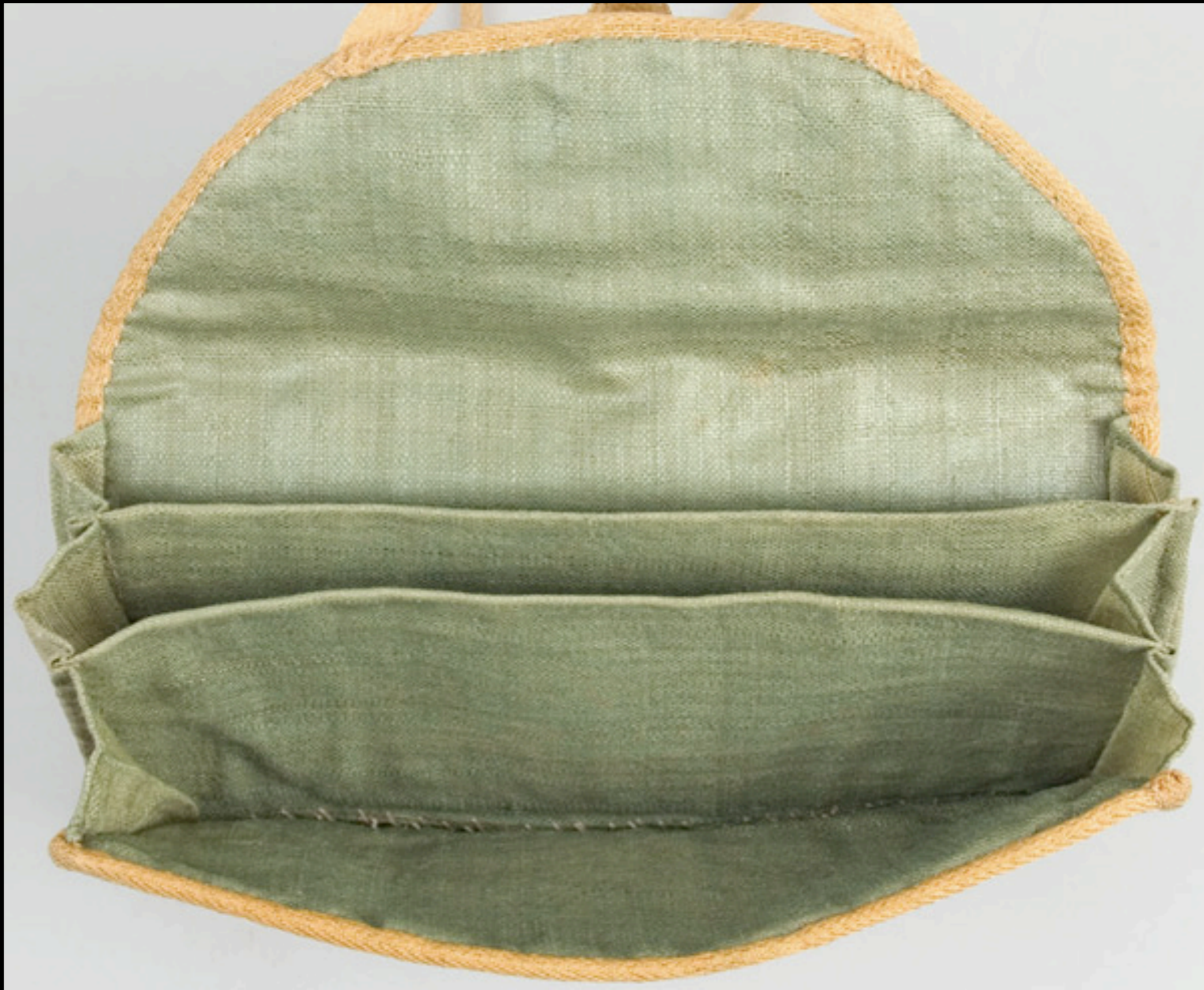
American Wool Embroidered Pocket Book from Townsend, Massachusetts Homestead Watercolor - 2nd Half 18th Century (Antiques Associates at West Townsend, Inc.)