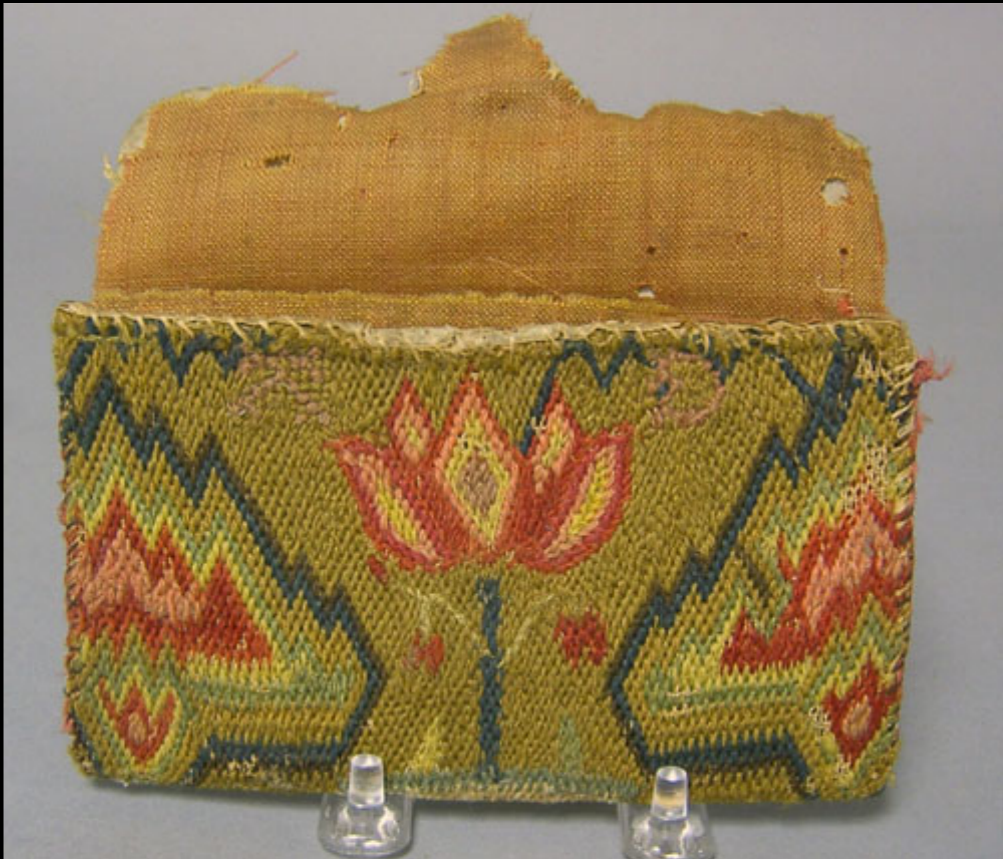
American Wool Embroidered Pocket Book Late 18th Century (Pook & Pook)