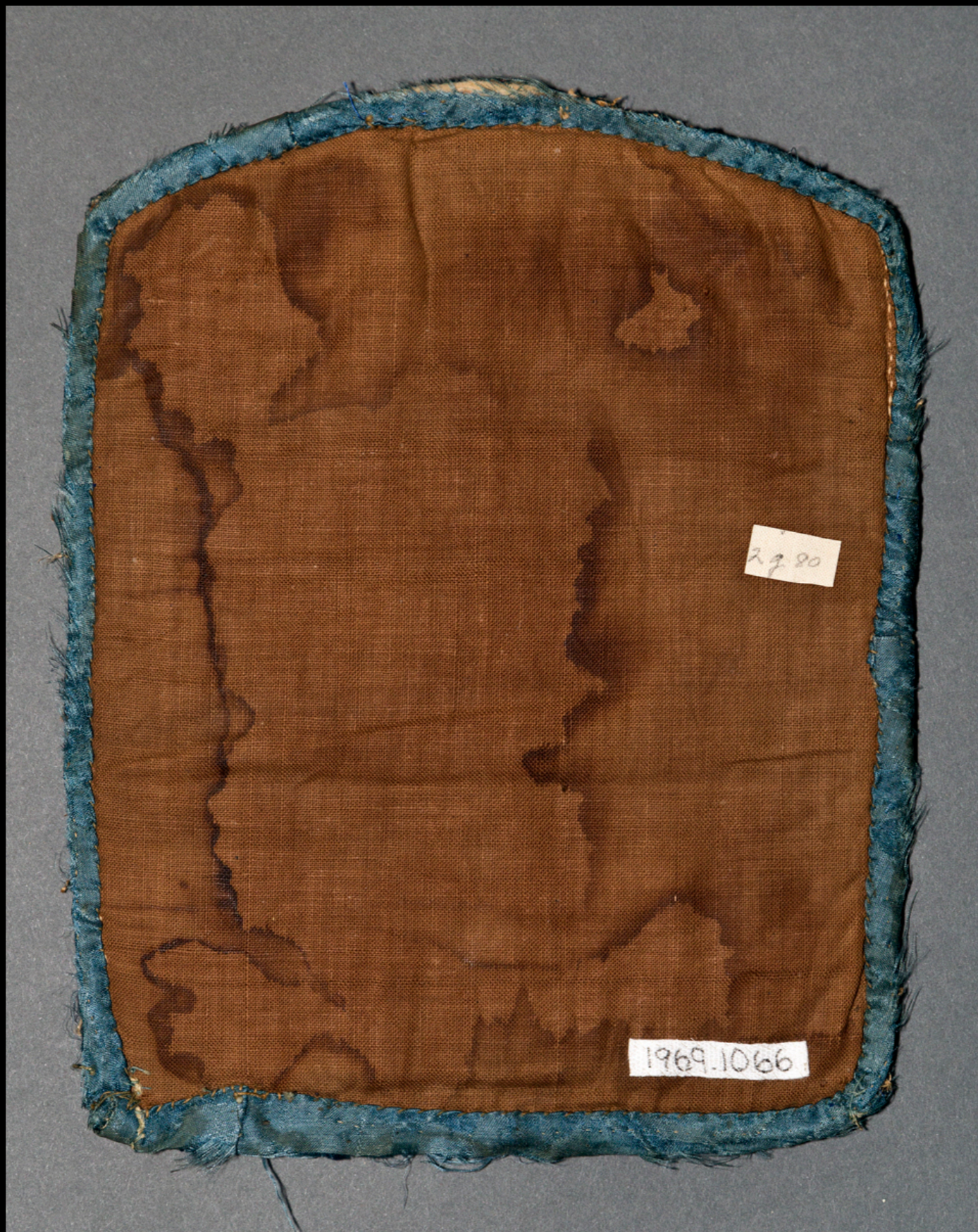
American Wool Embroidered Pocket Book c. 1730 - 1780 (Winterthur)