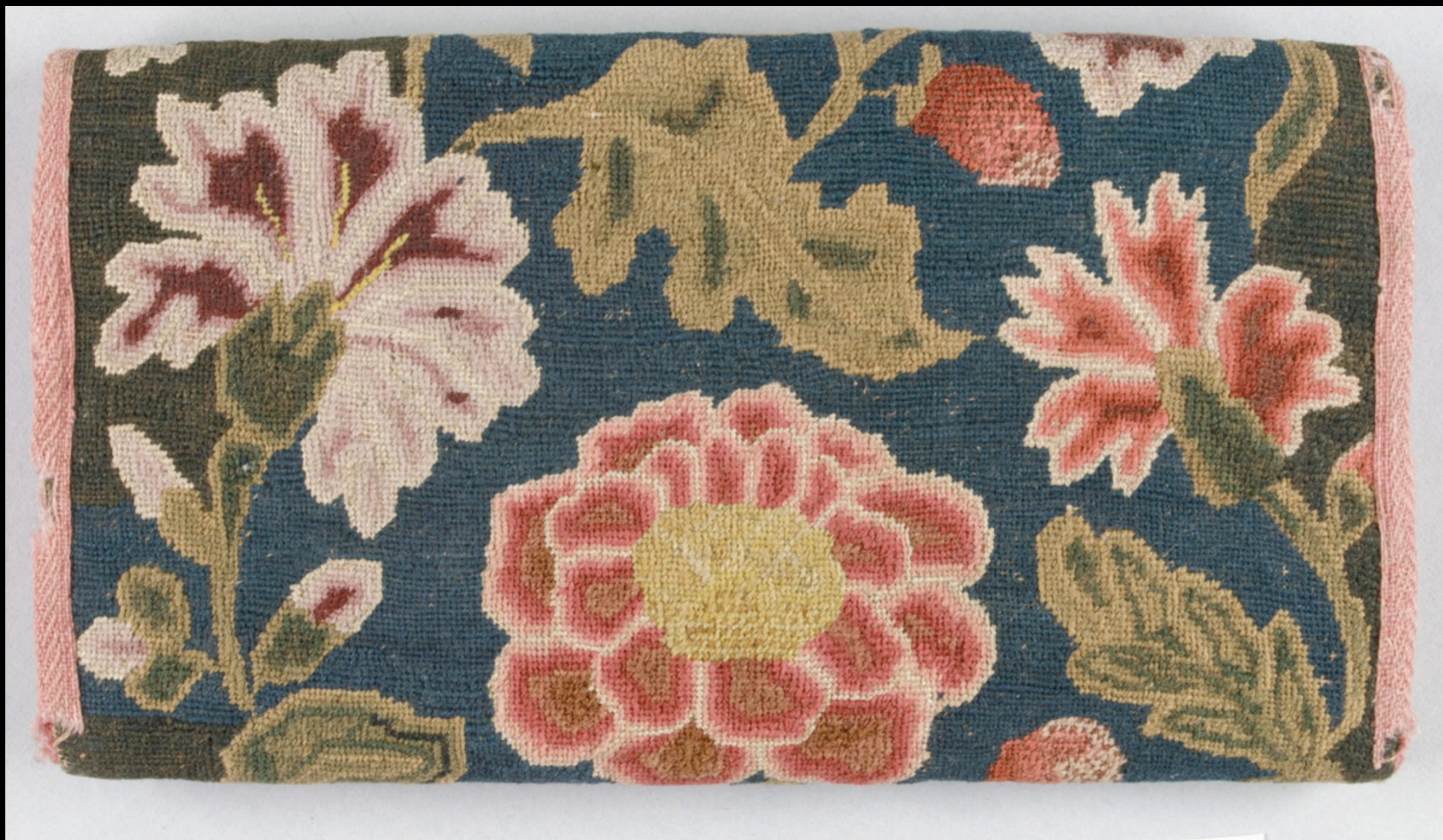
New England Wool Embroidered Pocket Book c. 1760