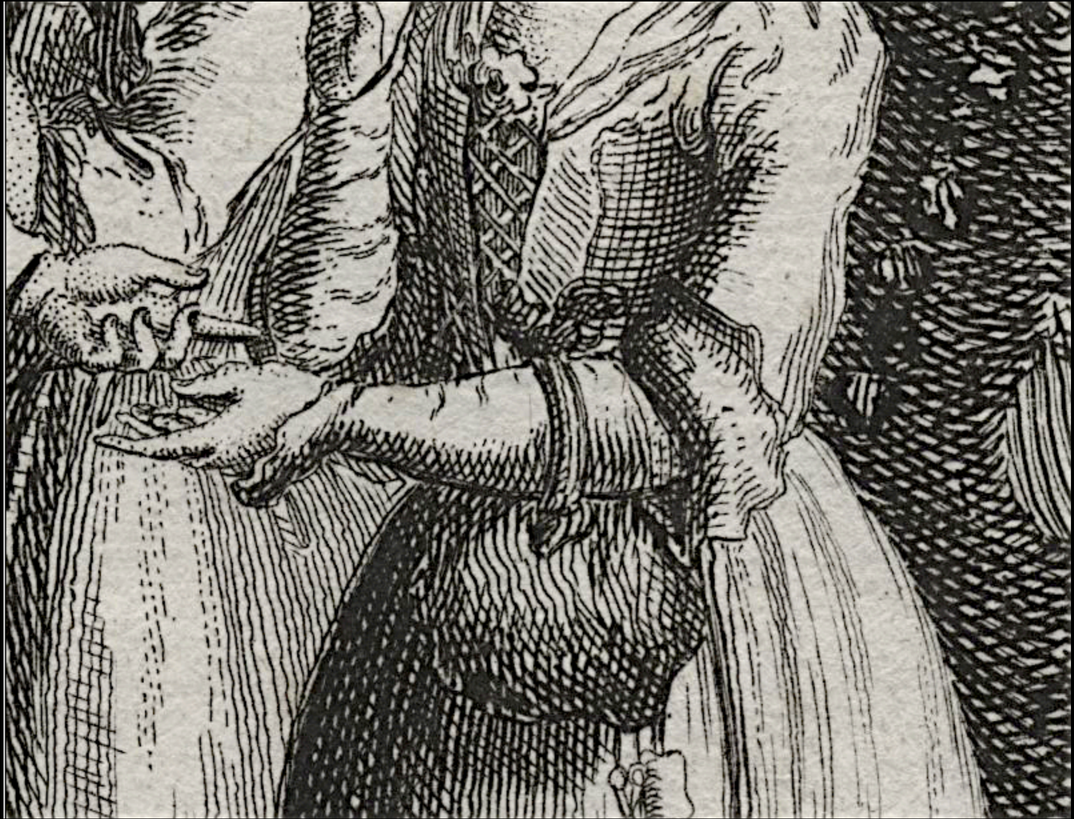
“Colonel Jack Robbing Mr. Smith going to Kentish Town” by Thomas Bowles 1767