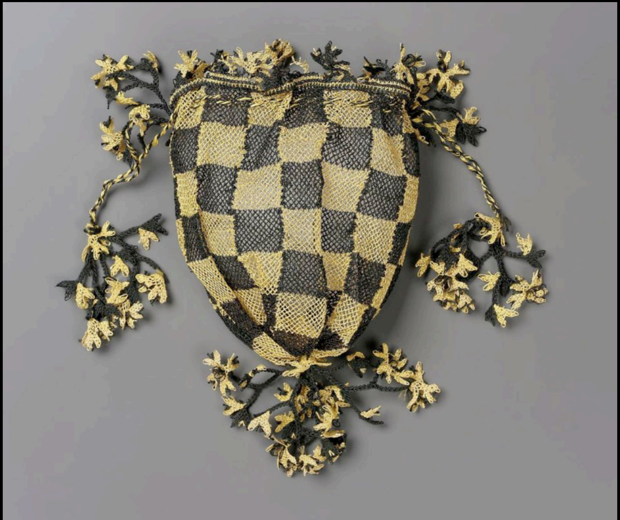
Drawstring Bag in Yellow & Black Biblia Work 18th Century (Museum of Fine Arts, Boston)