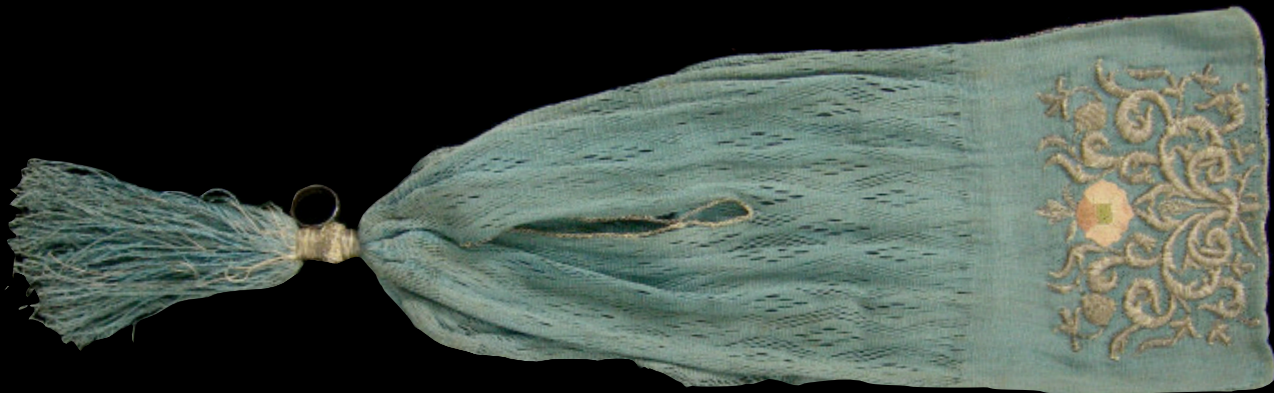
English Silk Sprang Stocking Purse with Metallic Needlework