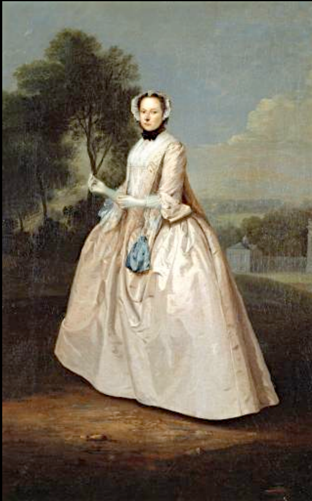
Portrait of a Lady c. 1750 (Tate Gallery)