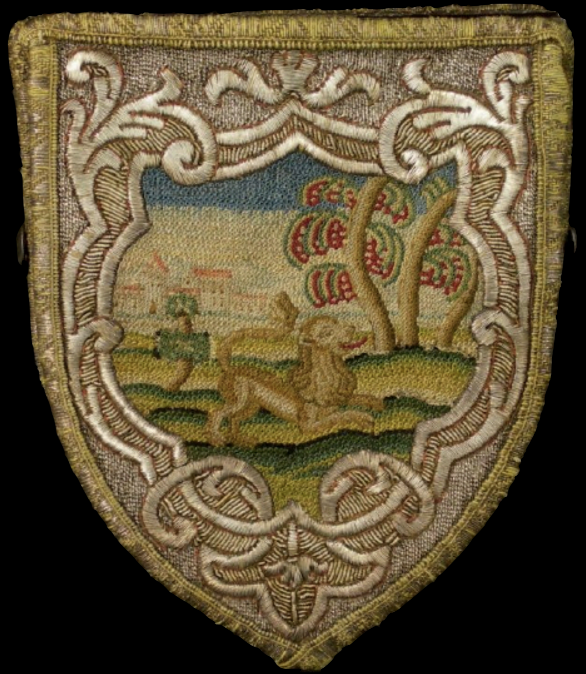
English Silk Shield - Shaped Purse c. 1700 - 1740 (Colonial Williamsburg)