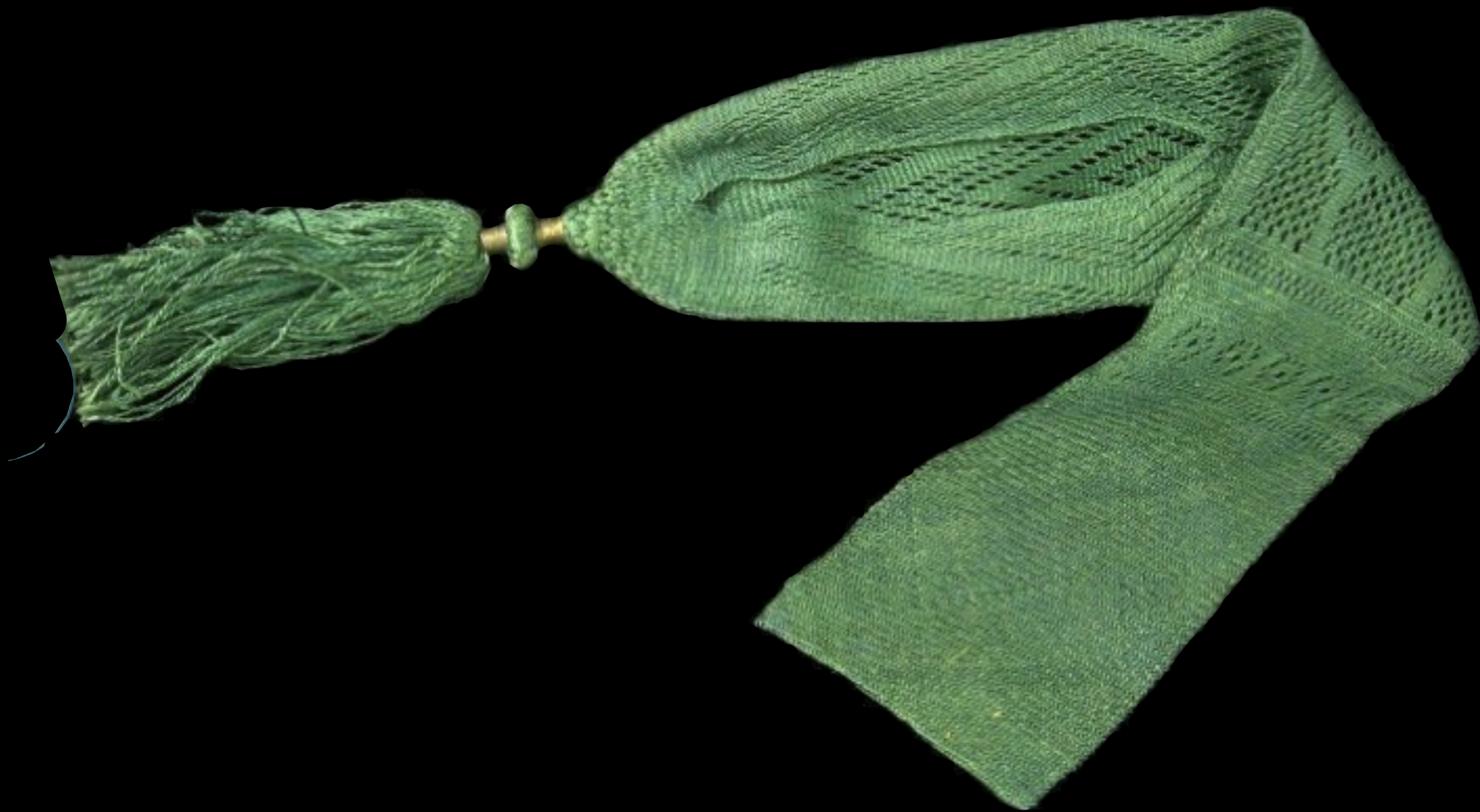
English Silk Sprang Stocking Purse