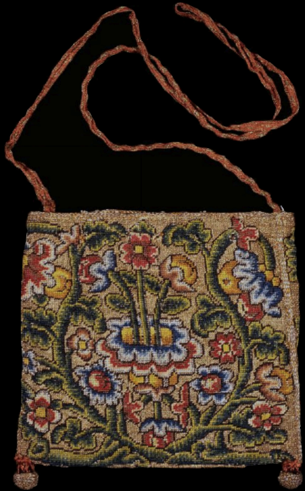
English Rectangular Canvaswork Purse or Bag Silk and Metallic Needlework on Linen Canvas c. 1600 - 1625