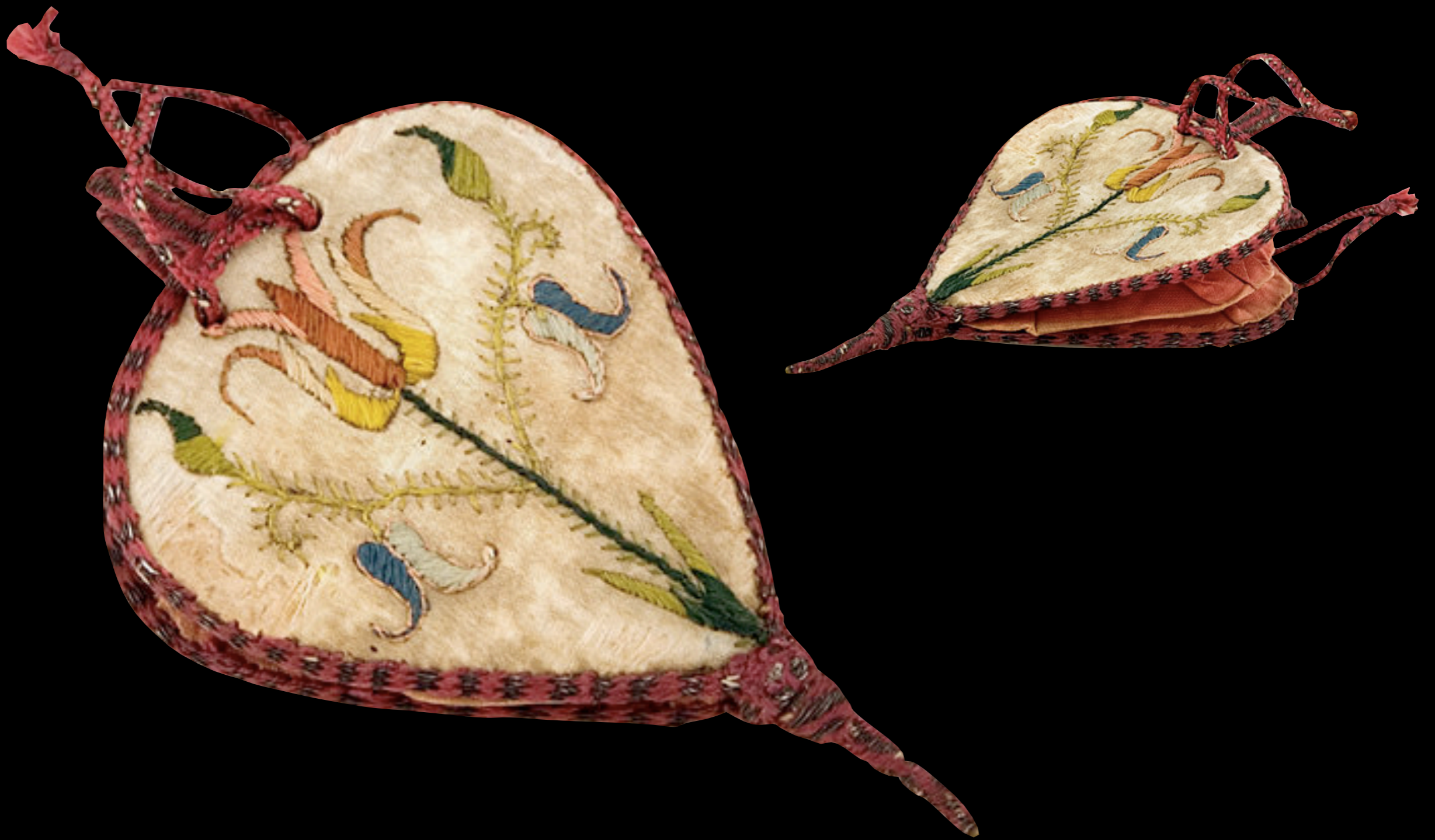
English Embroidered Silk Drawstring Purse 17th Century (Private Collection)