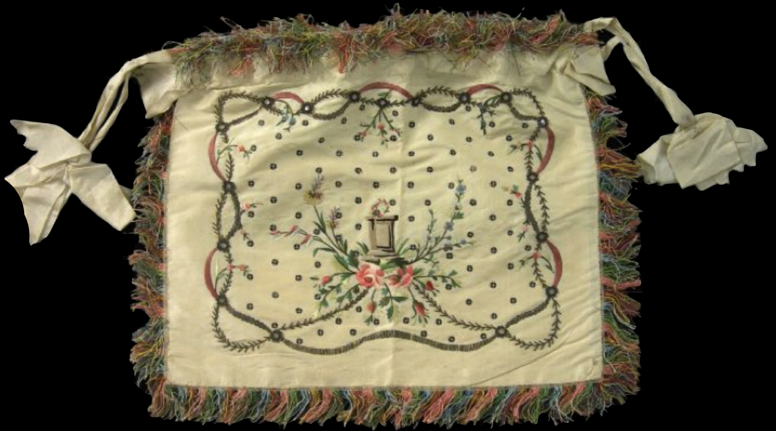
French Cream Work Bag or Purse Silk Embroidered with Silk, Metal Sequins, and Silk Fringe c. 1780 (Colonial Williamsburg)