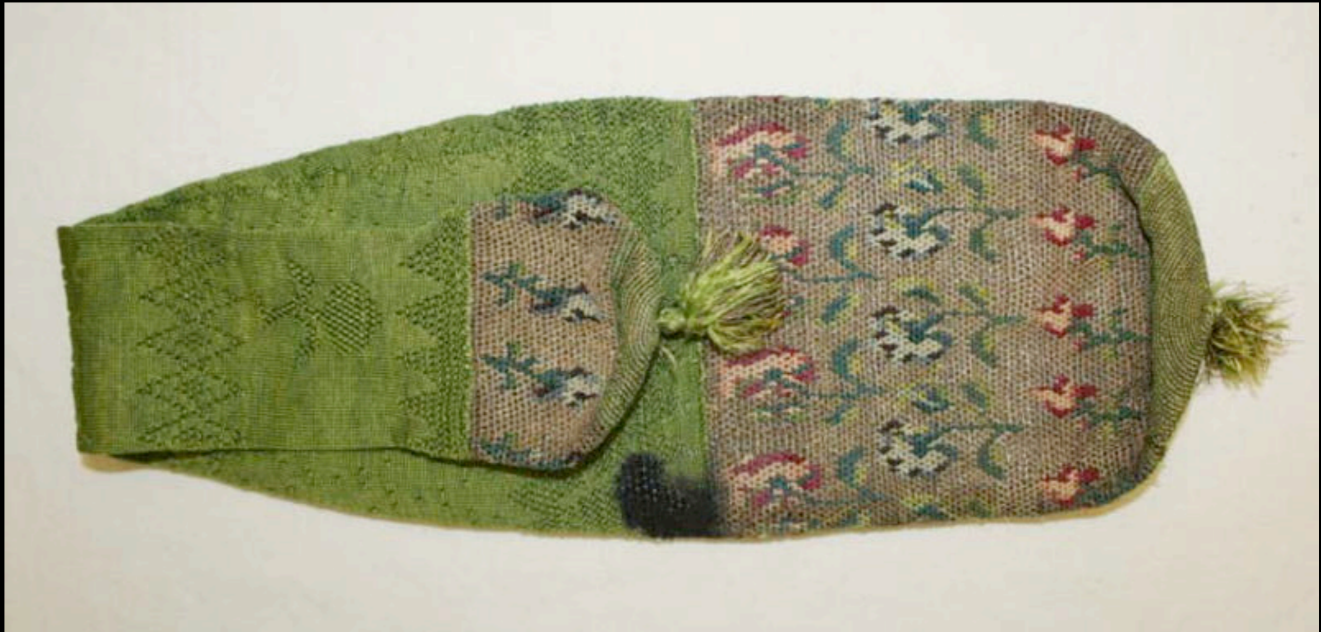
English Stocking Purse Early 18th Century (The Costume Institute)