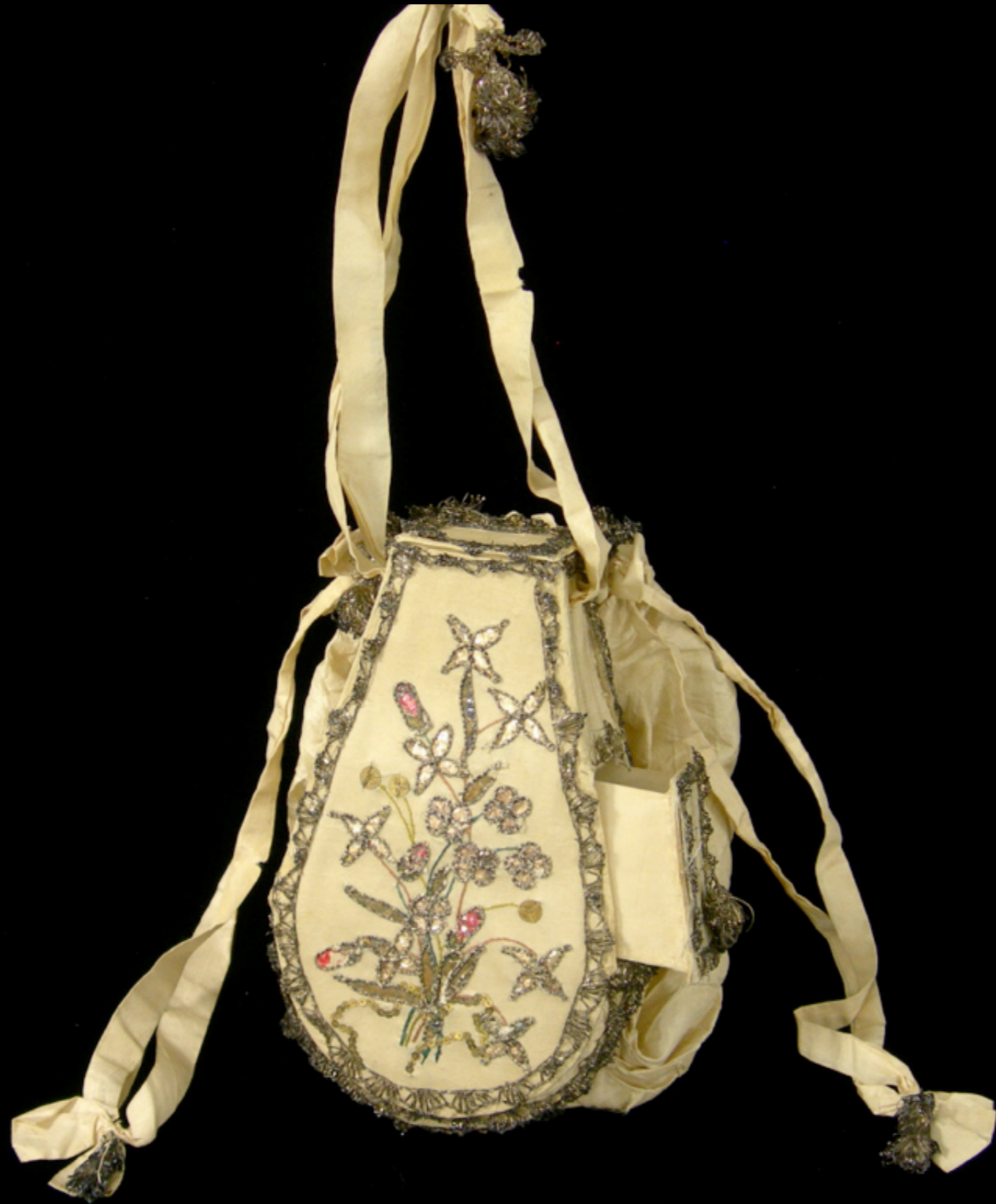
English Work Bag c. 1760 - 1780 (Colonial Williamsburg)