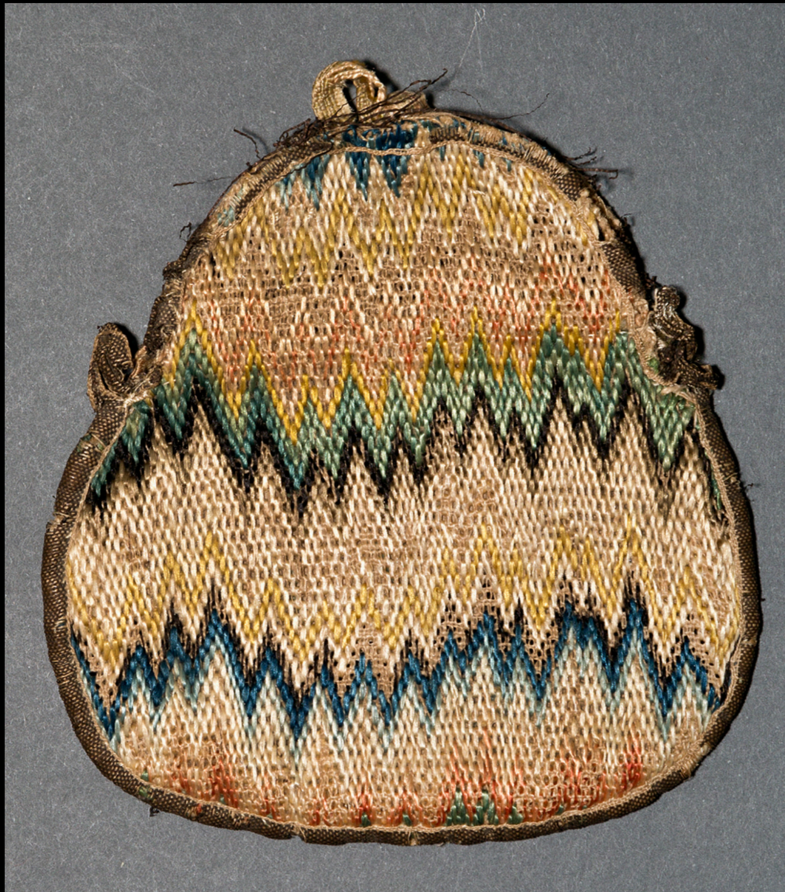
English or American Wool Embroidered Irish / Flame Stitch Purse