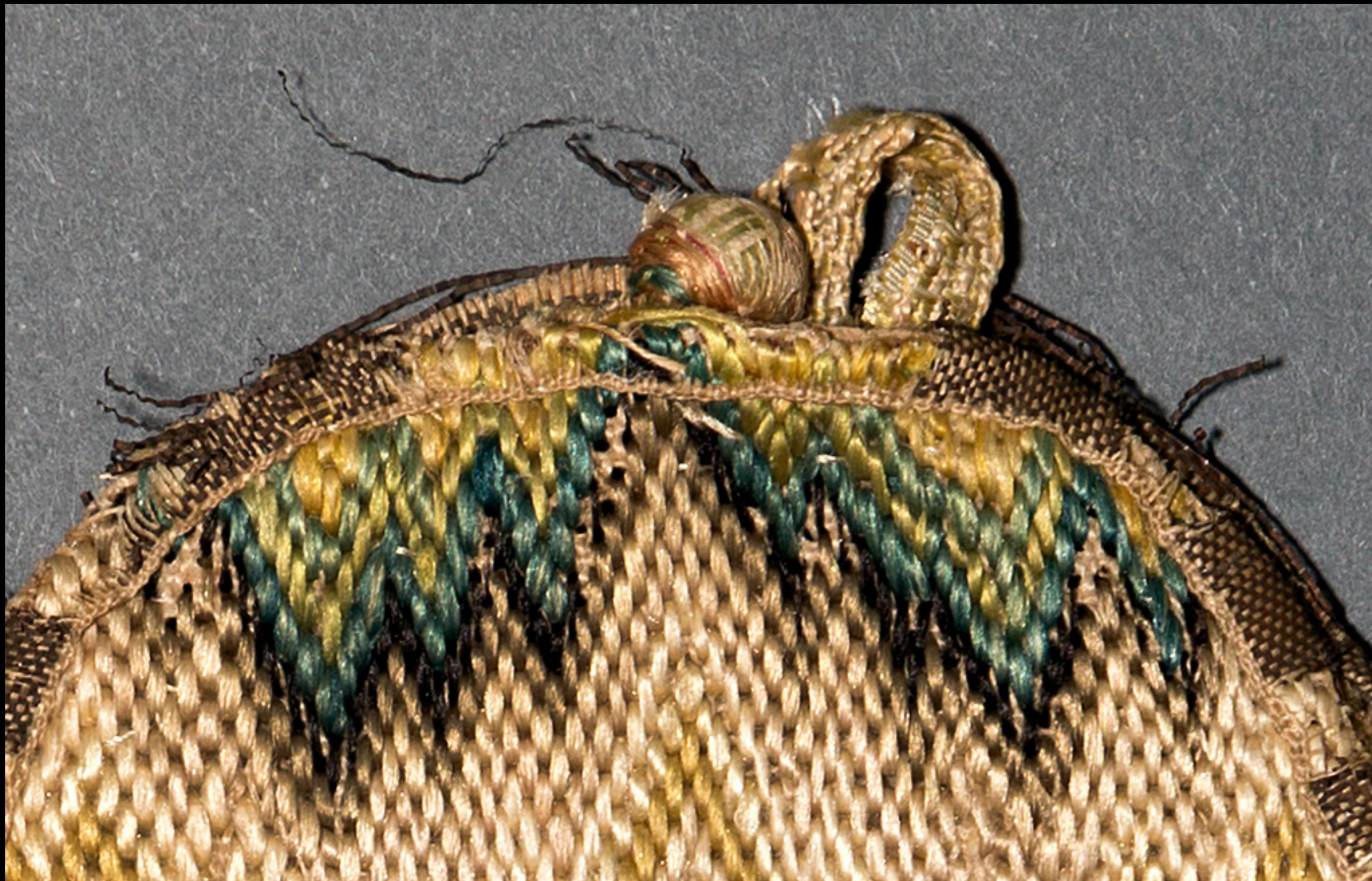
English or American Wool Embroidered Irish / Flame Stitch Purse