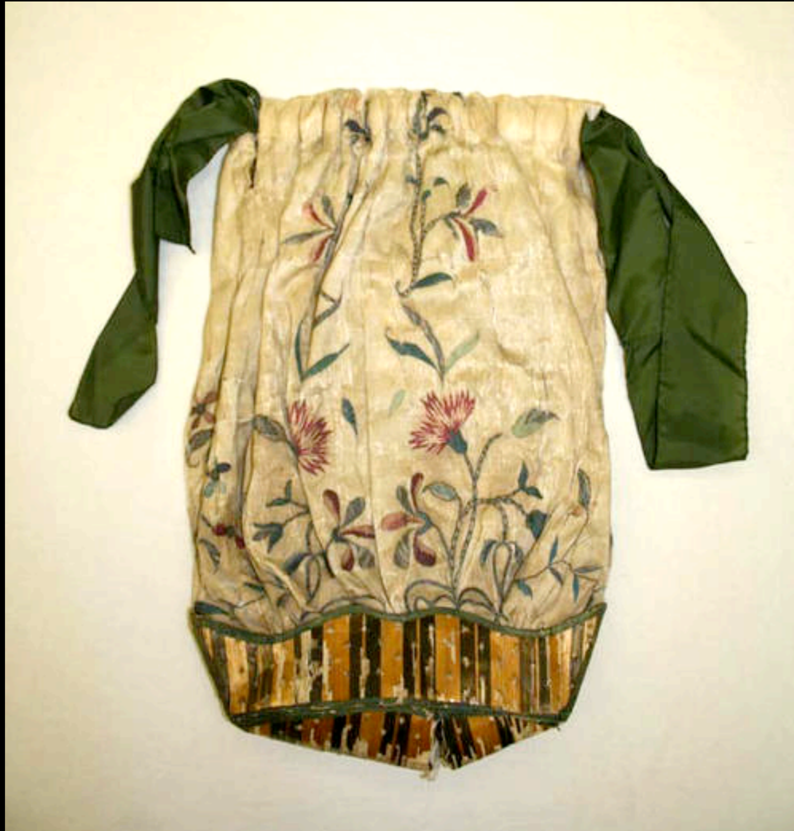
English Reticule Bag 18th Century (Costume Institute)