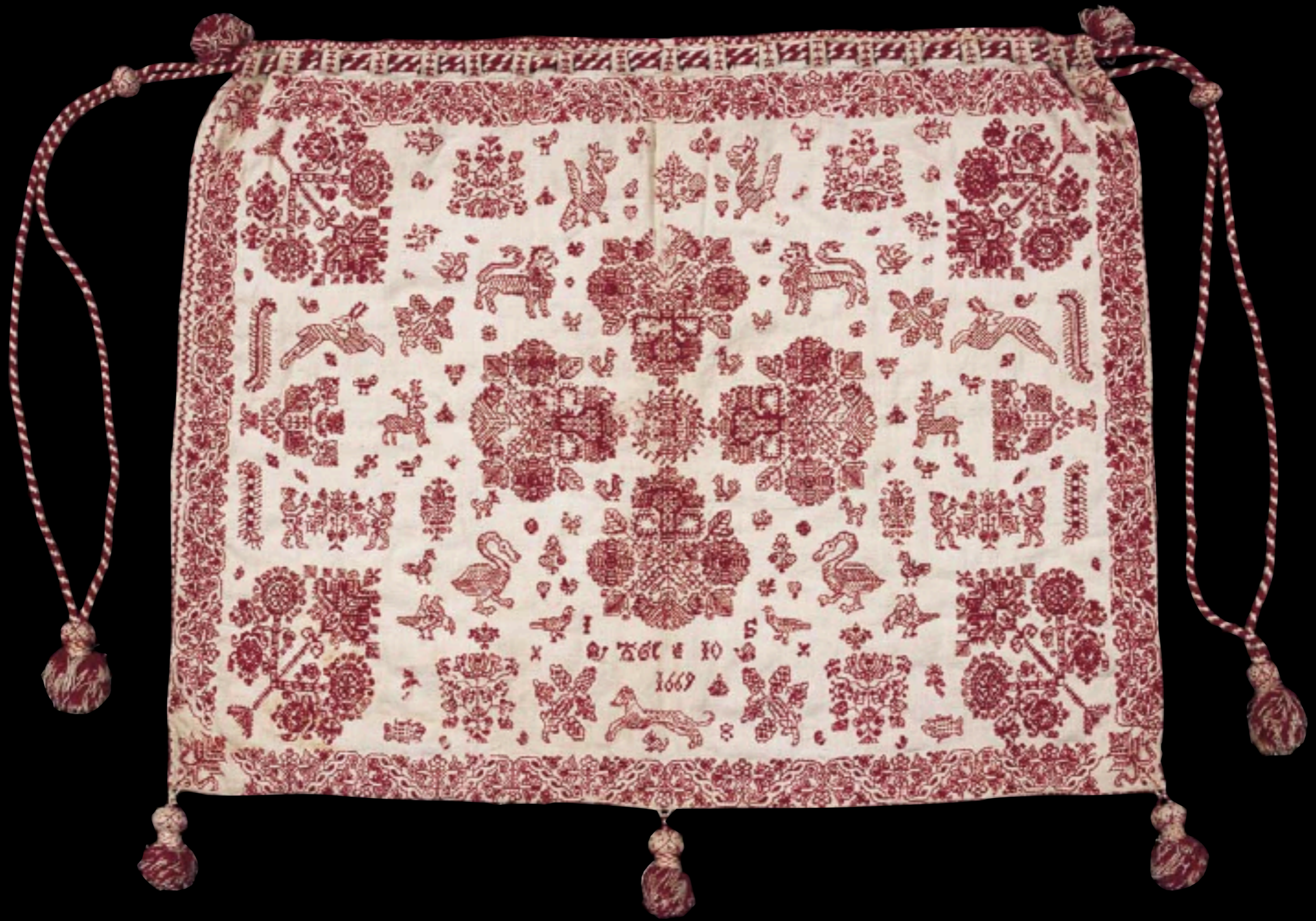
English Red Work Bag 1699 (Metropolitan Museum of Art)