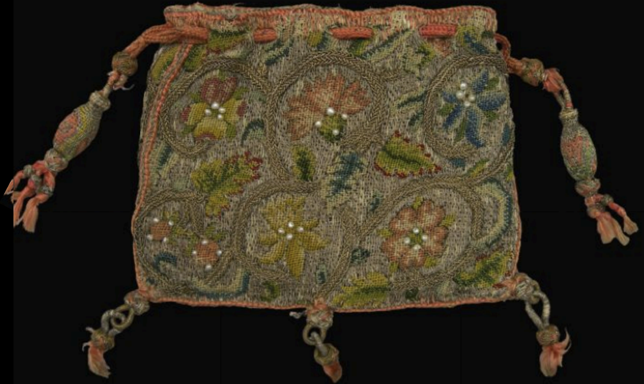
English Purse or "Sweet Bag" Silk with Silver Gilt Metallic Threads, and Pearls on Linen c. 1600 - 1625 (Colonial Williamsburg)