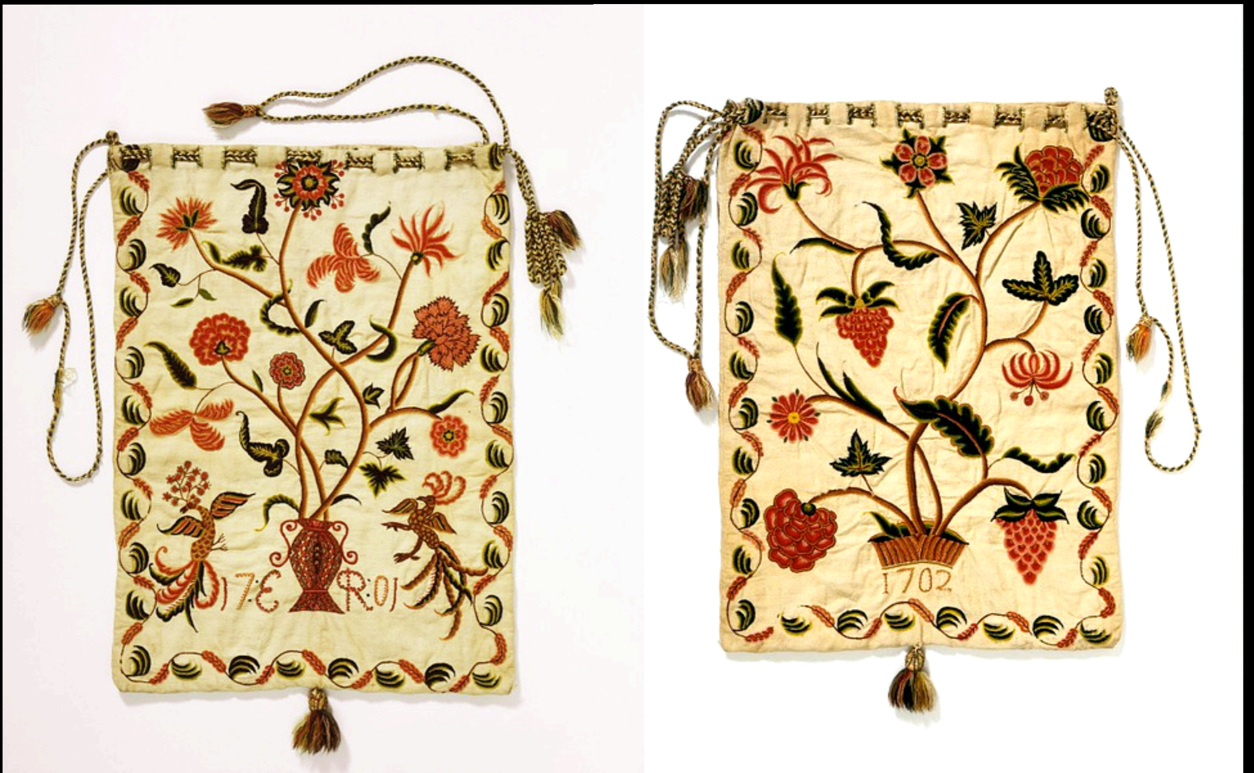
English Work Bag Dated 1701 & 1702 (Victoria & Albert Museum)