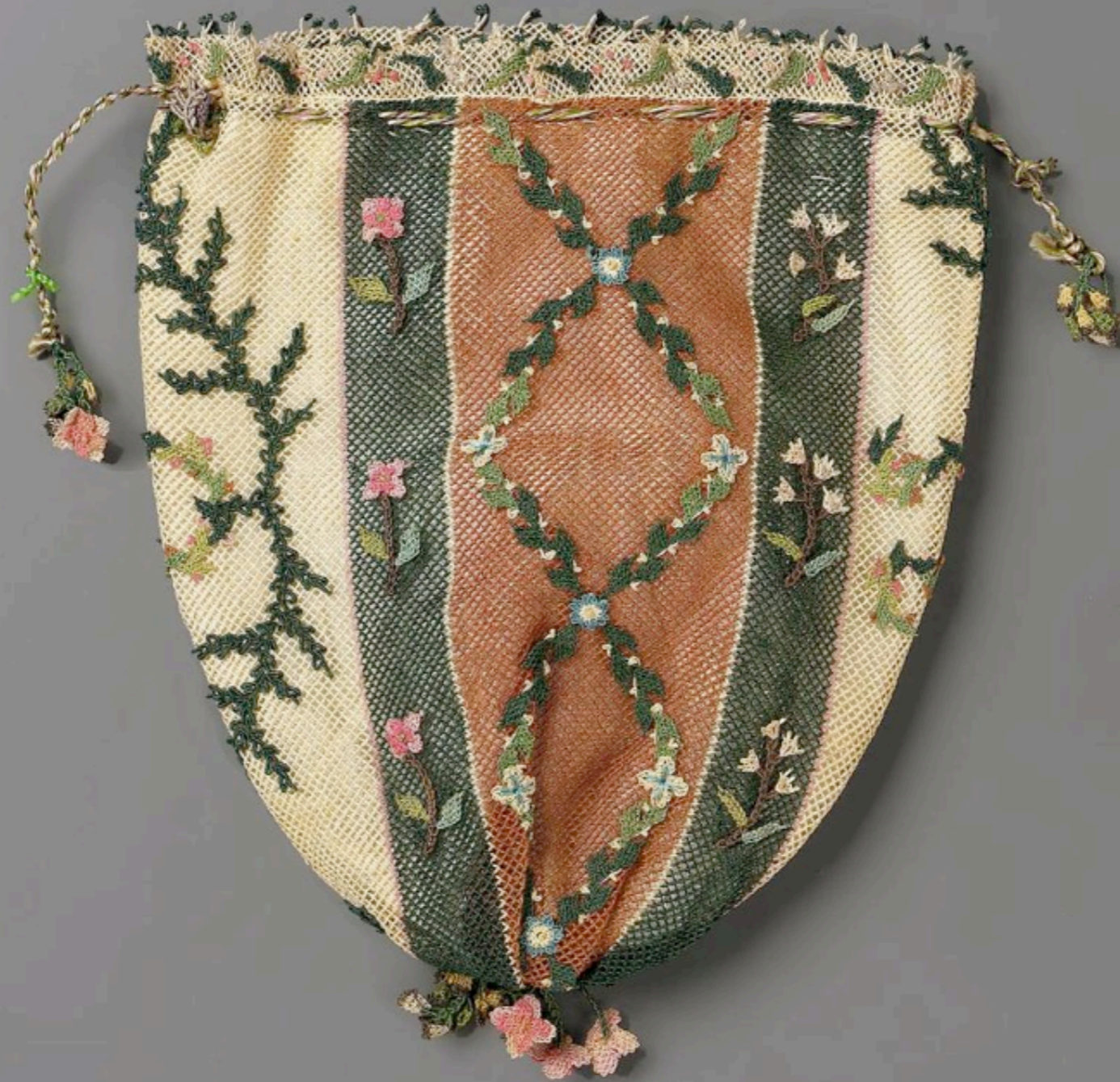
English Drawstring Silk Biblia Bag 18th Century (Museum of Fine Arts, Boston)