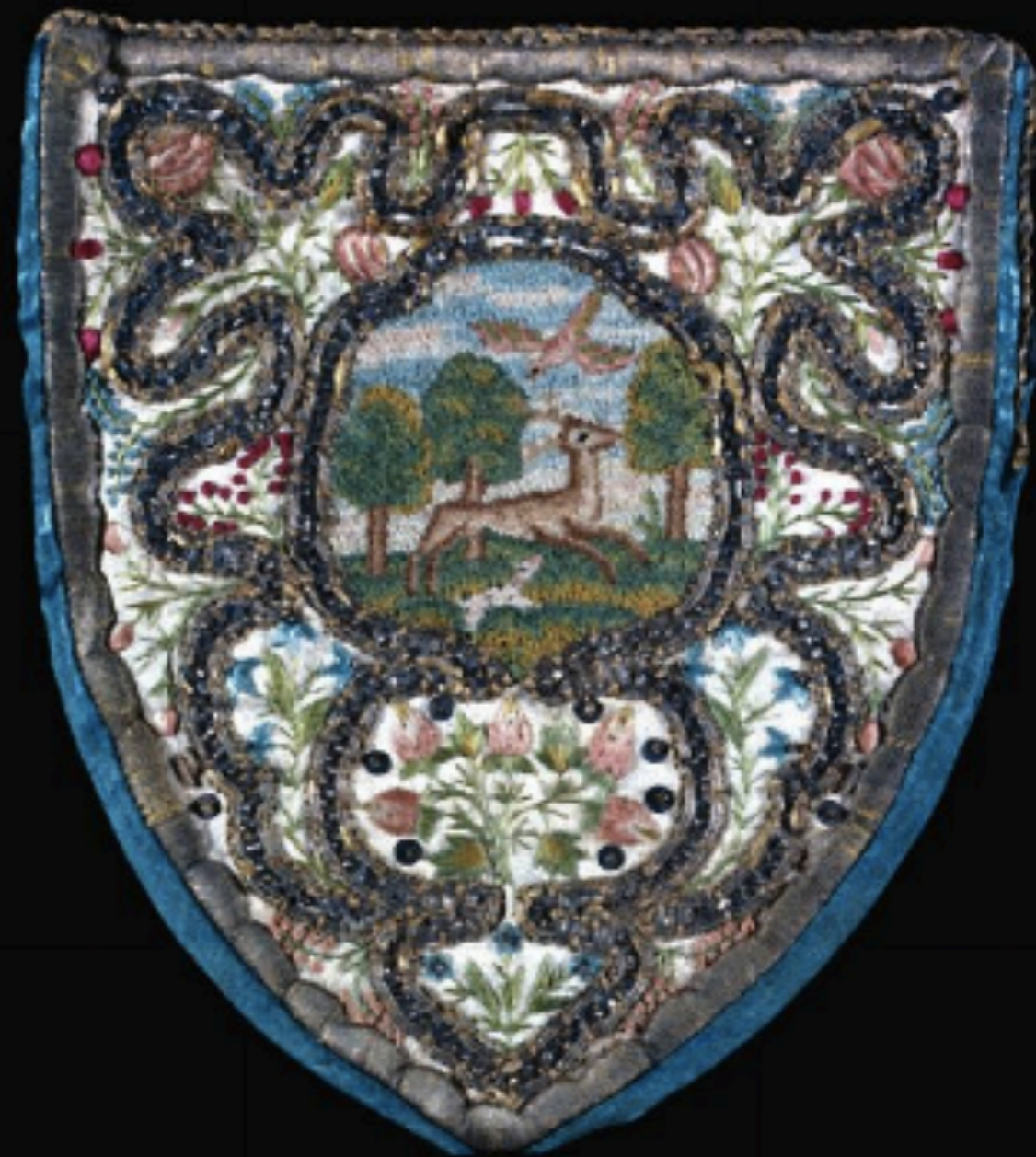
French or German Shield Shaped Purse Silk Embroidered with Silk and Silver - Gilt Threads c. 1730 - 1745 (Colonial Williamsburg)