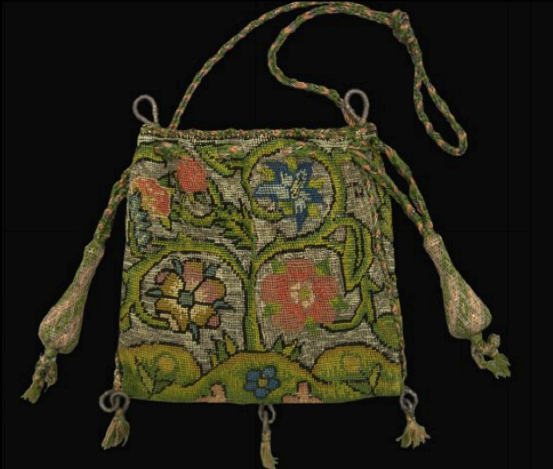
English Drawstring Bag Silk with Metallic Threads on a Linen Ground c. 1600 - 1625 (Colonial Williamsburg)