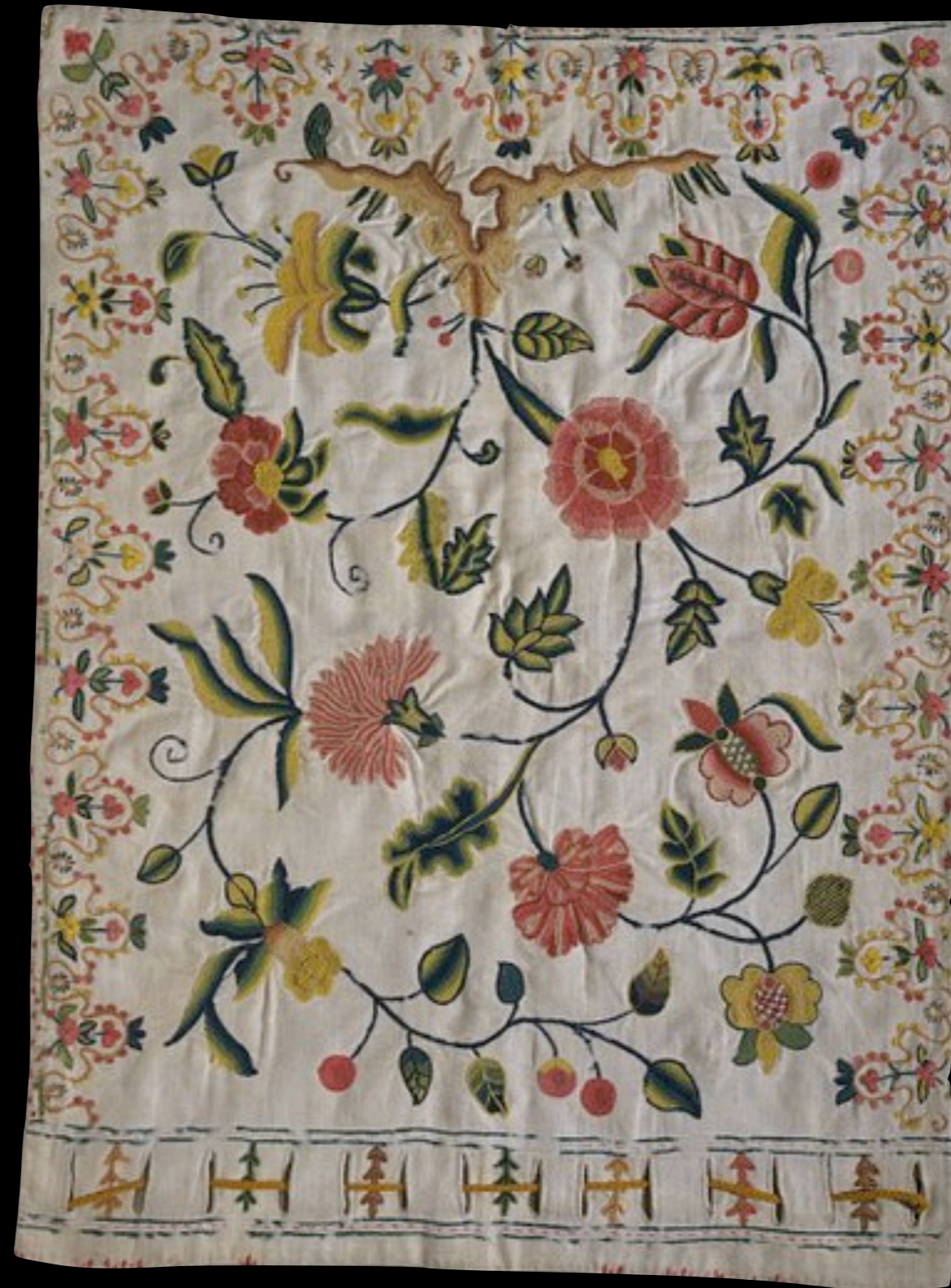
English Work Bag 1712 (Victoria & Albert Museum)