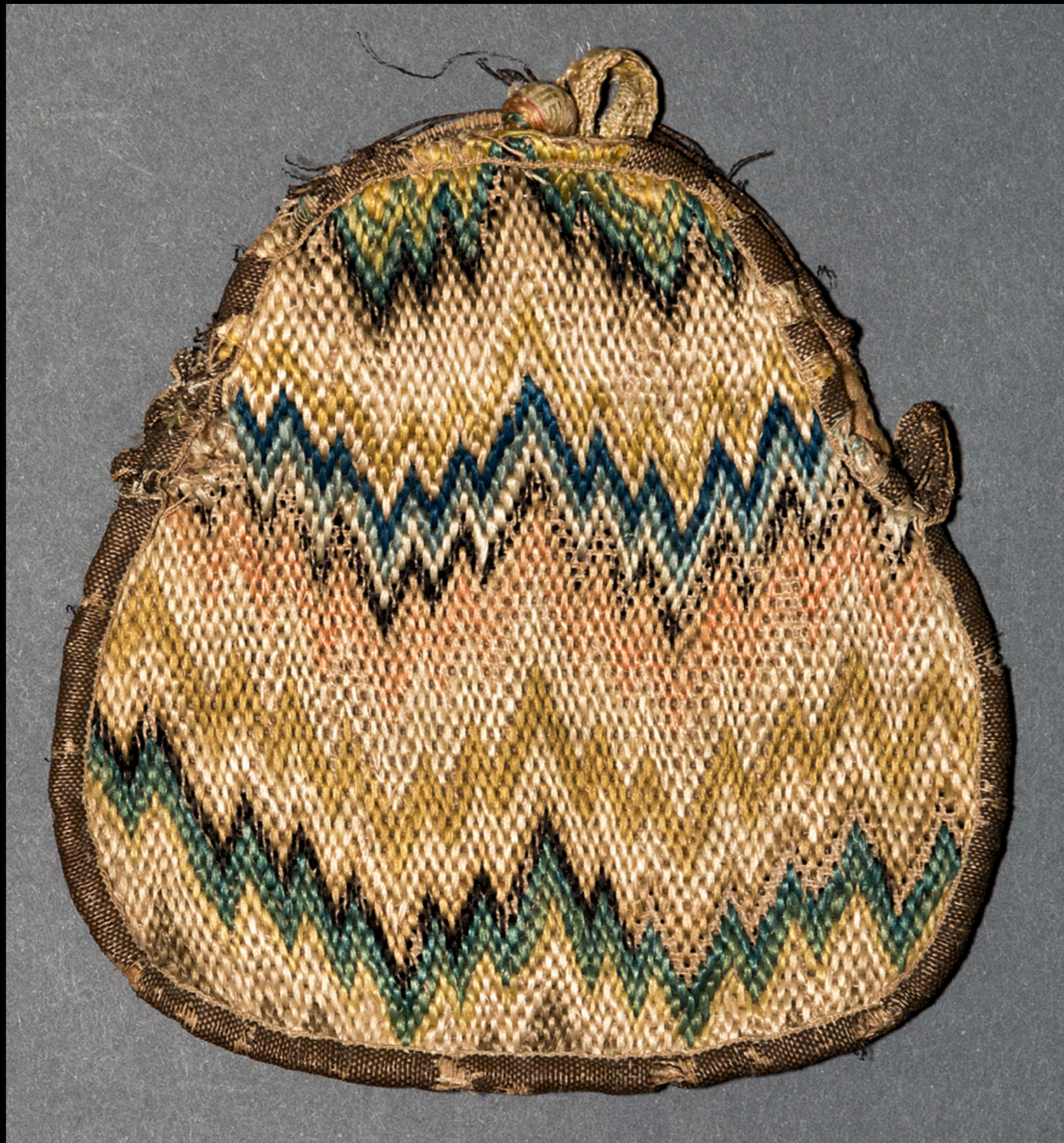
English or American Wool Embroidered Irish / Flame Stitch Purse